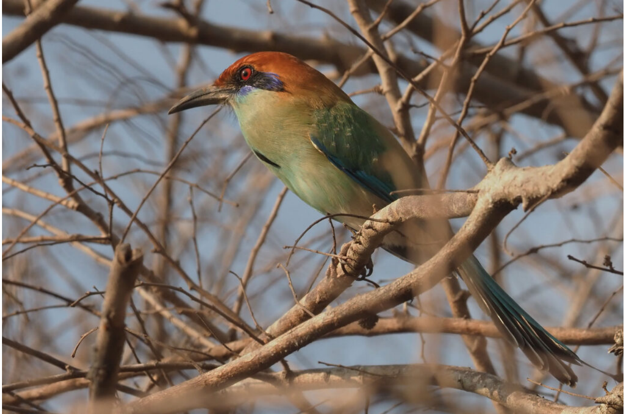
Russet-crowned Motmot