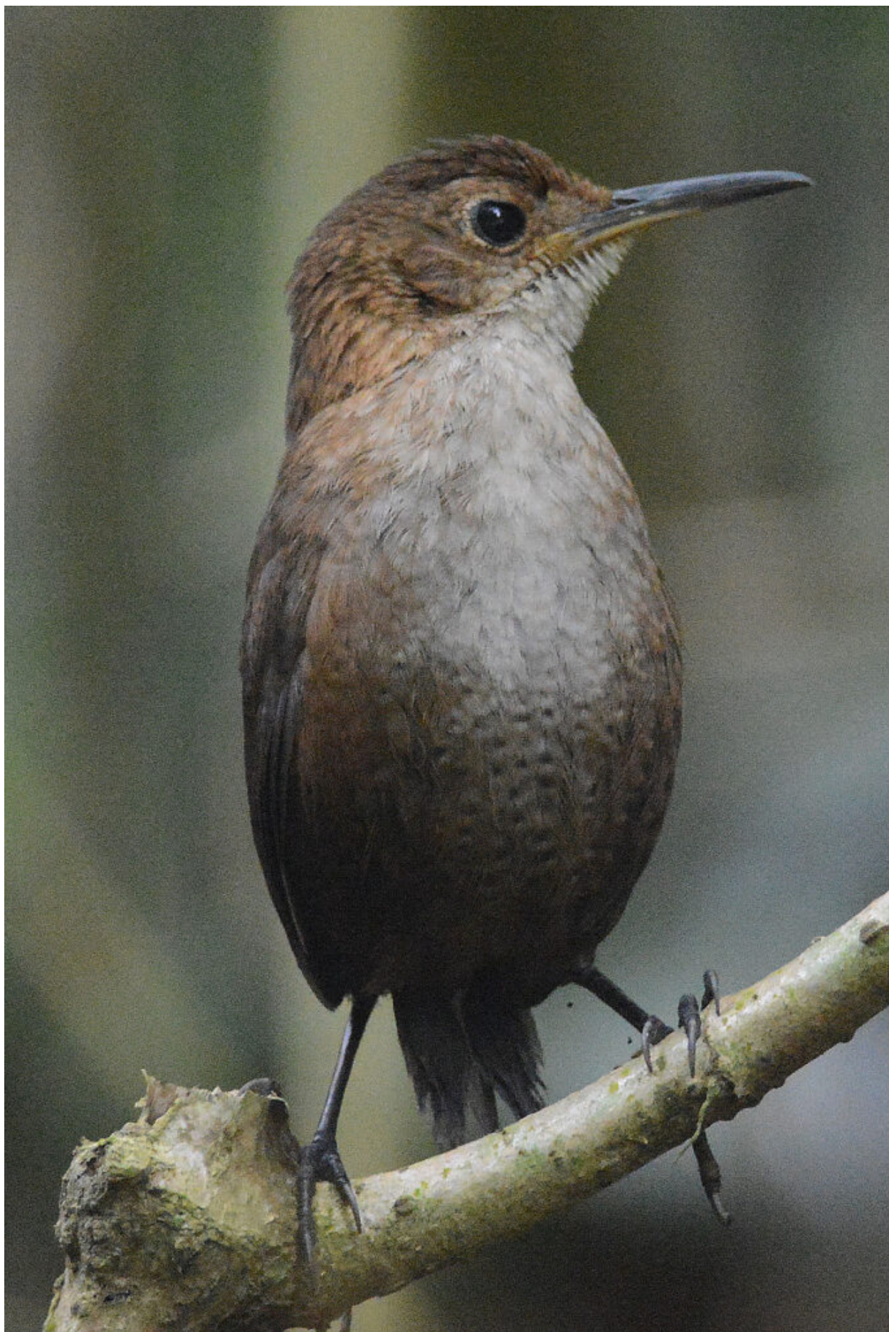
Nava's Wren