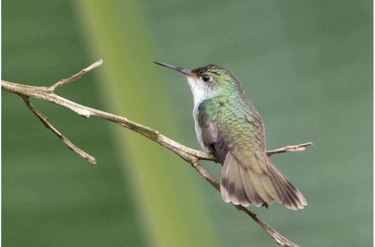
White-bellied Emerald