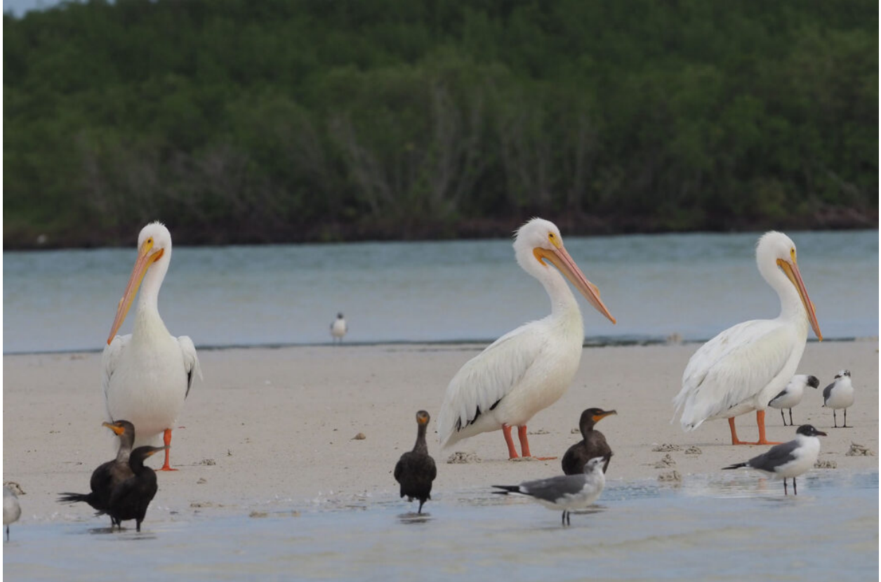
American White Pelicans