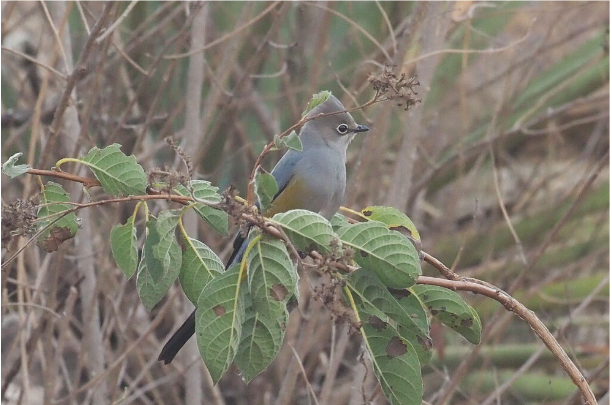
Grey Silky-flycatcher