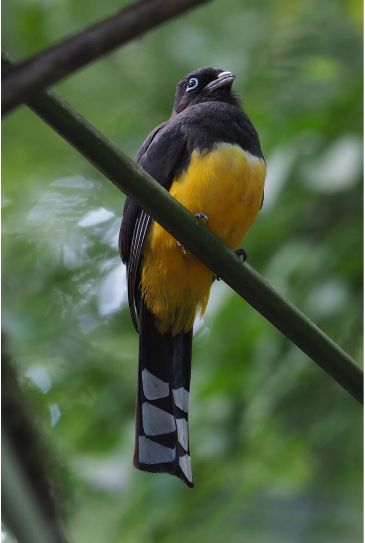
Black-headed Trogon