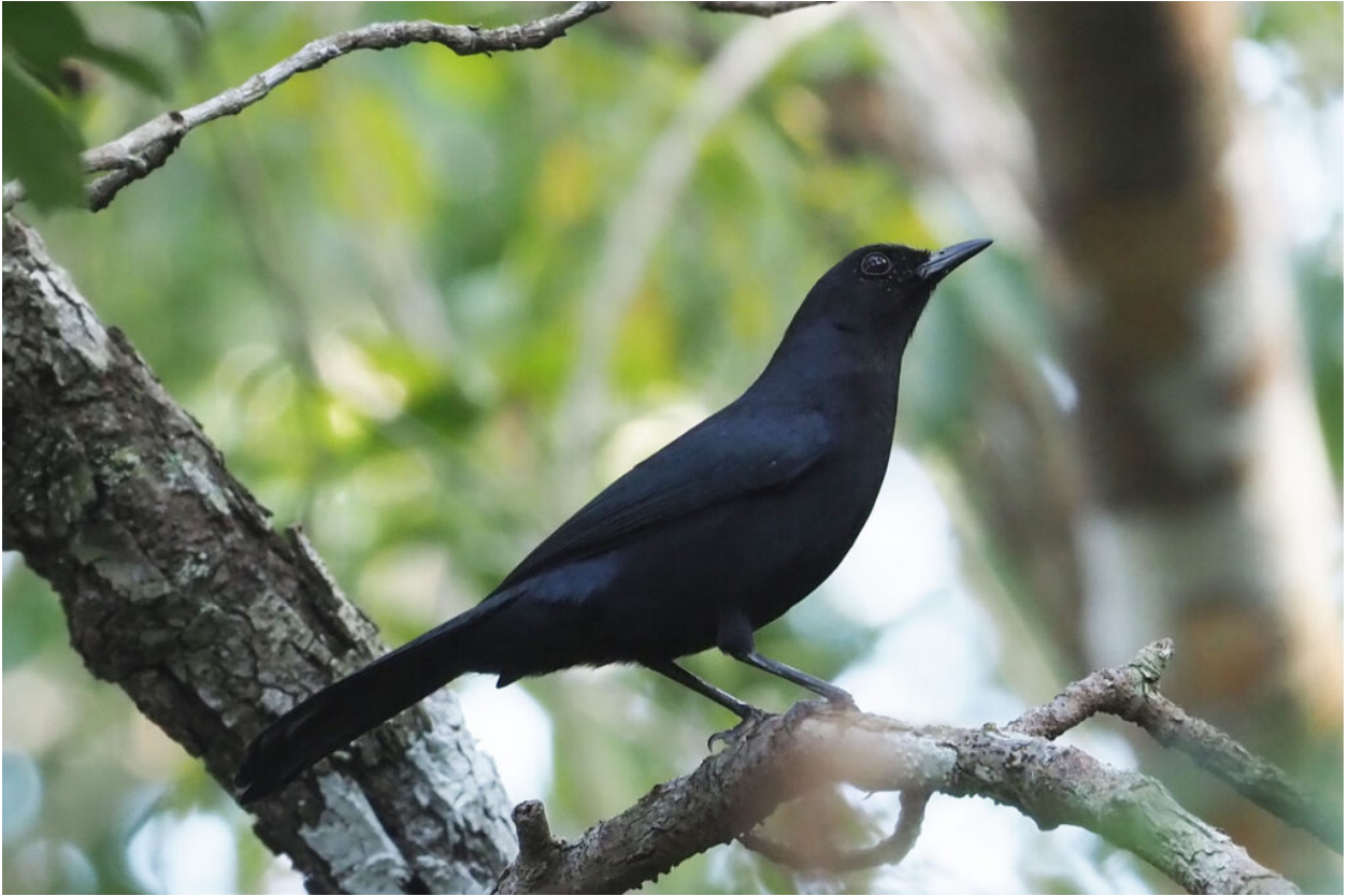
Black Catbird