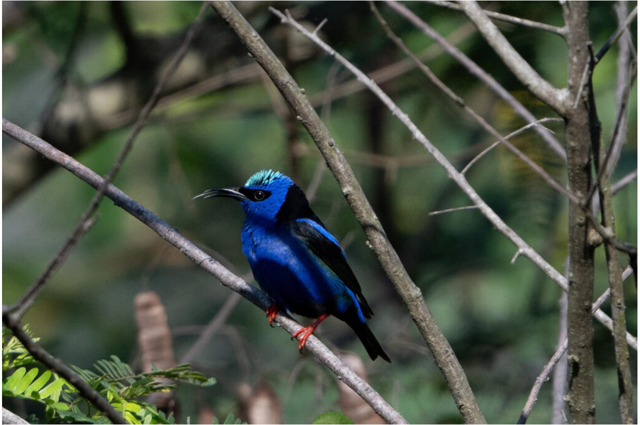
Red-legged Honeycreeper