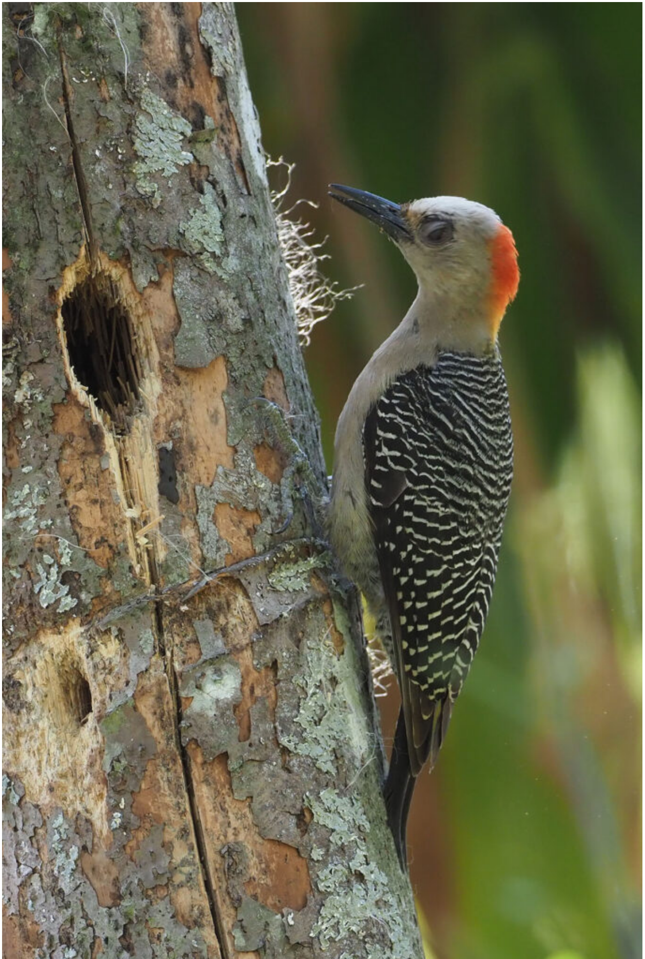
Velasquez's Woodpecker