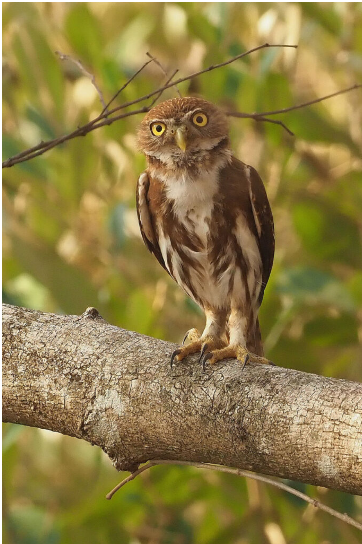
Ferruginous Pygmy Owl