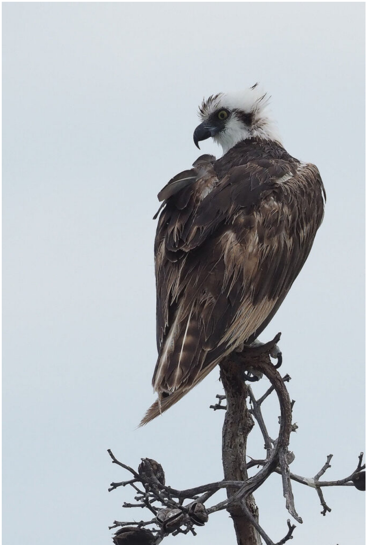
Osprey