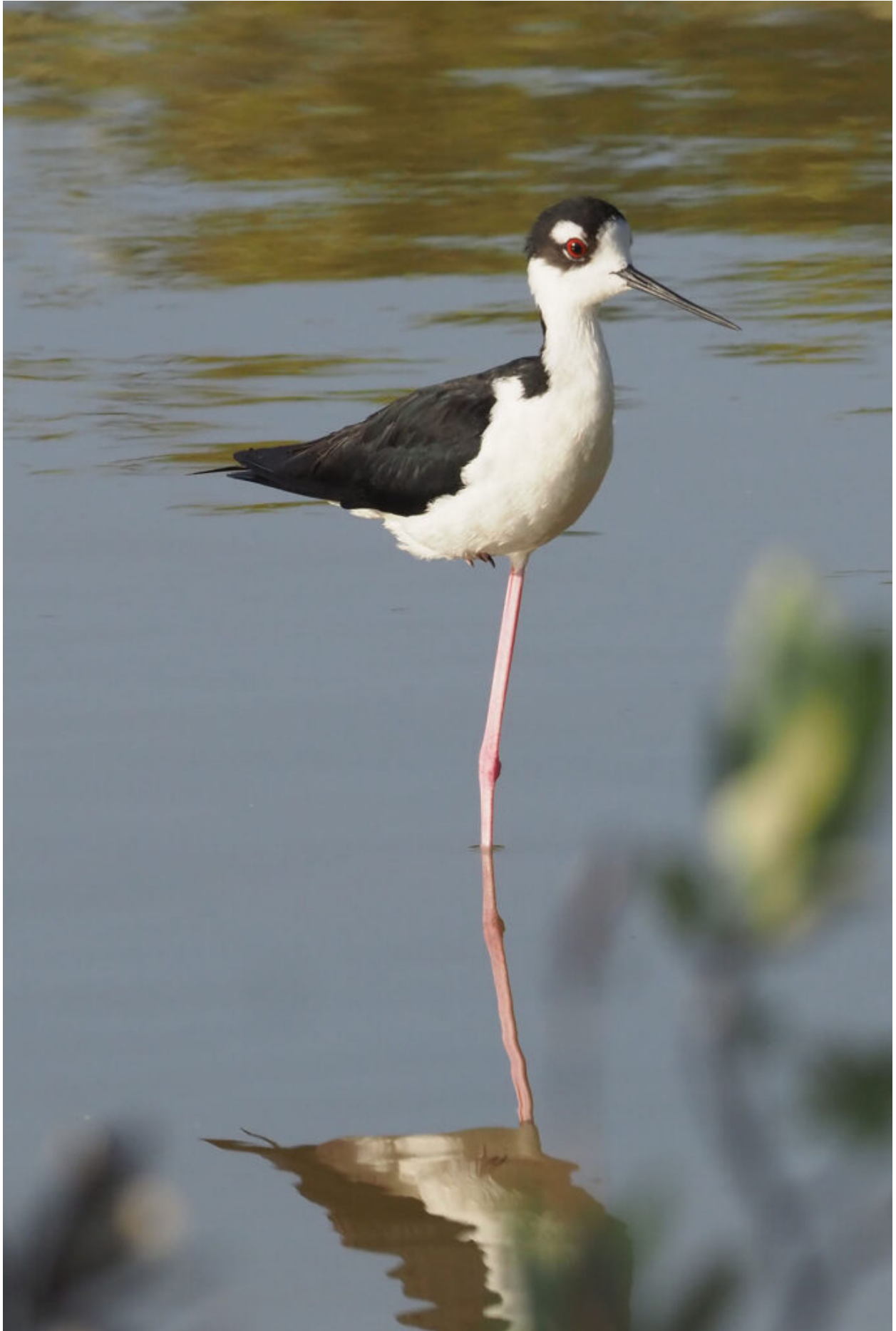
Black-necked Stilt