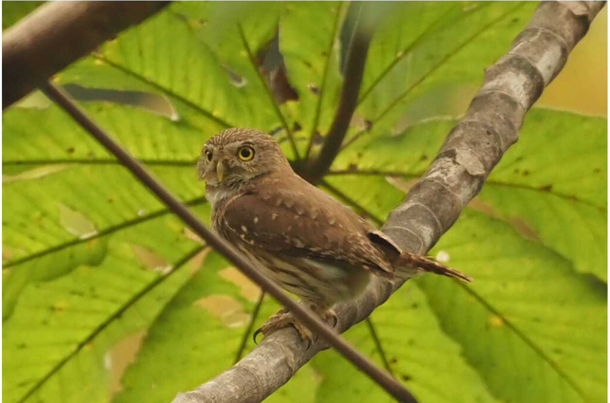
Colima Pygmy Owl