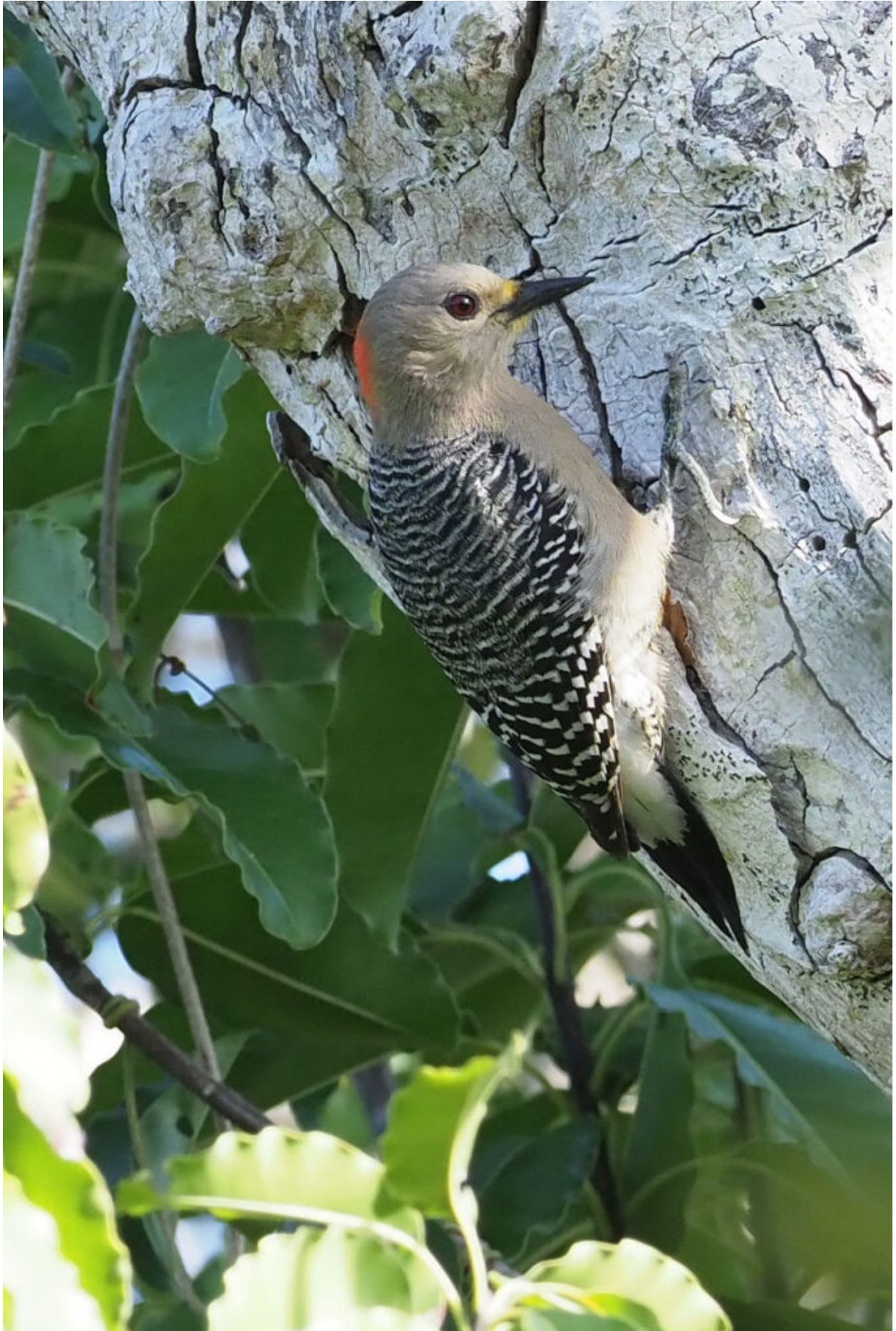
Yucatan Woodpecker