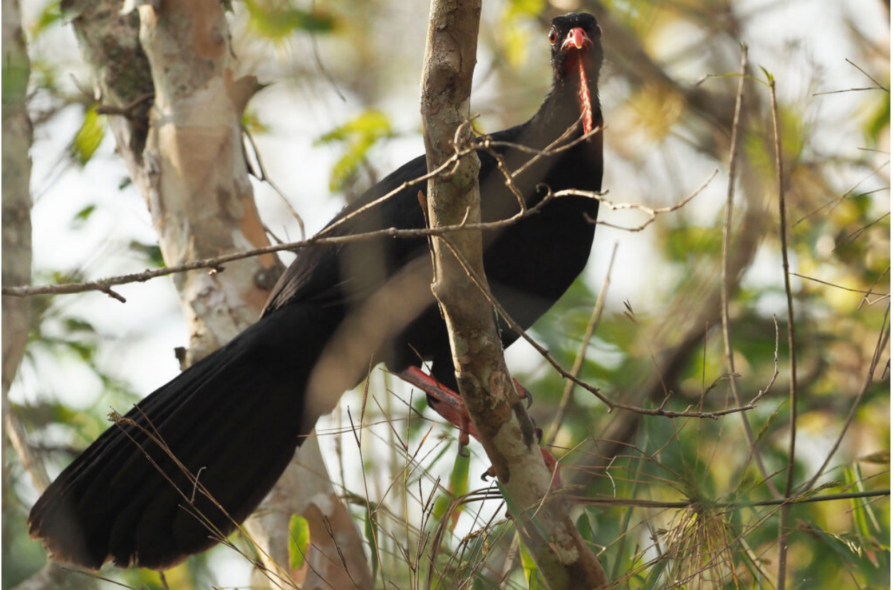
Highland Guan