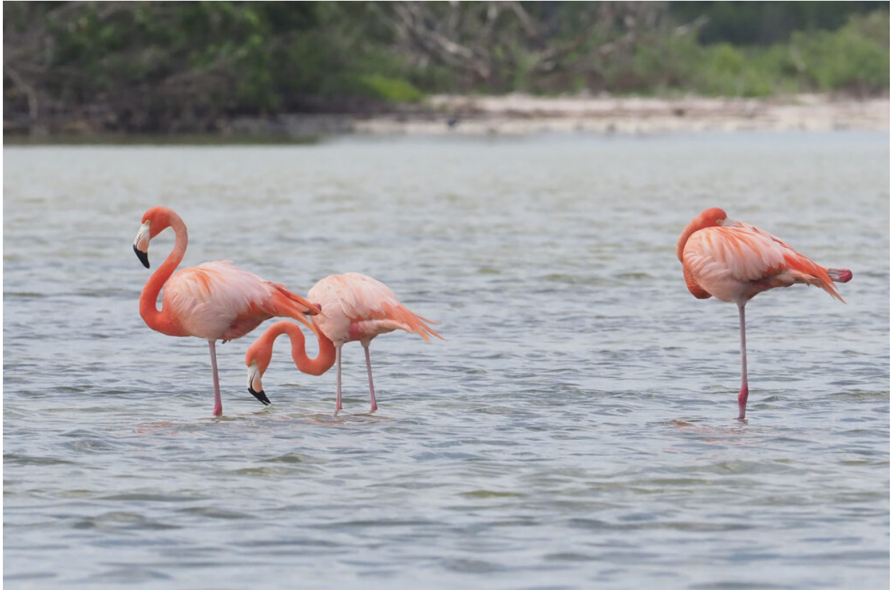
American Flamingos