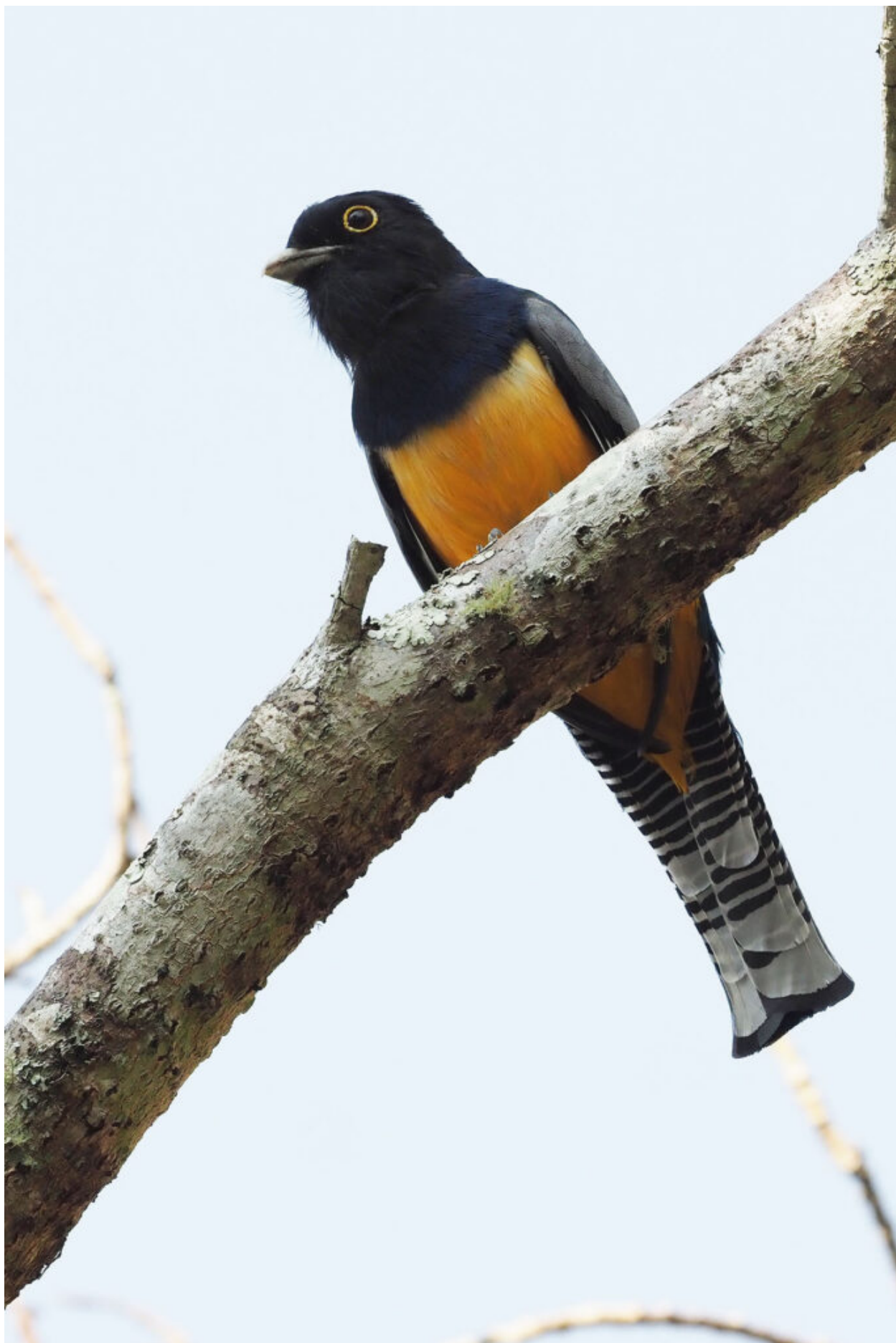
Gartered Trogon