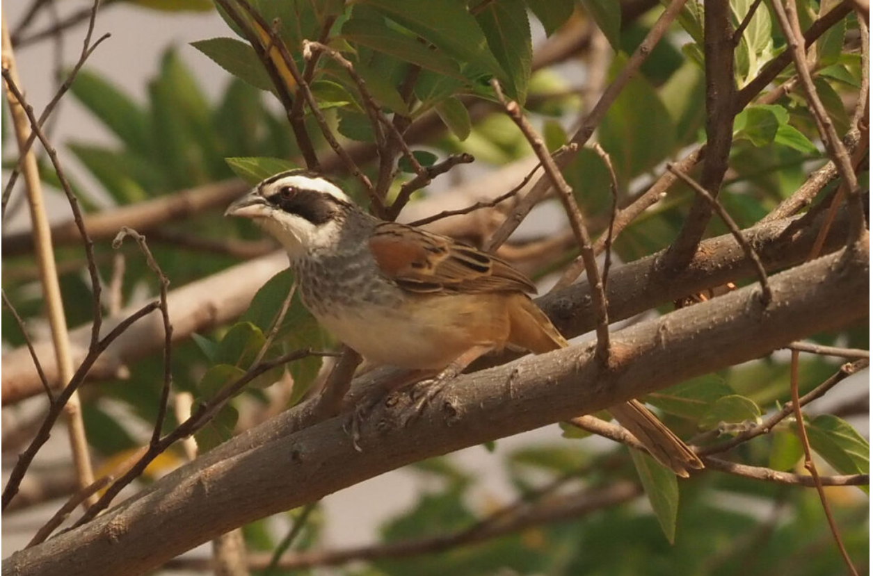
Stripe-headed Sparrow