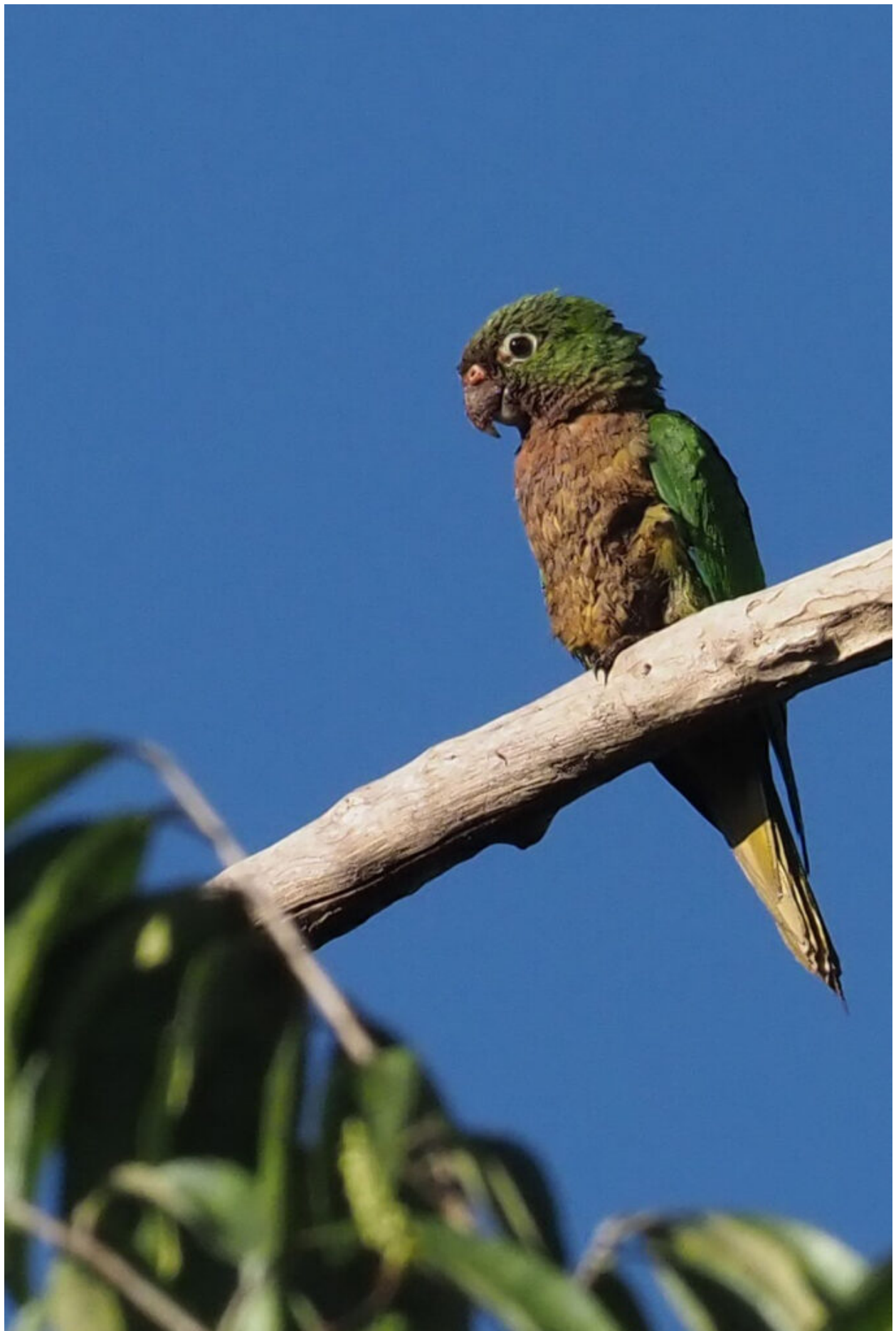
Olive-throated Parakeet