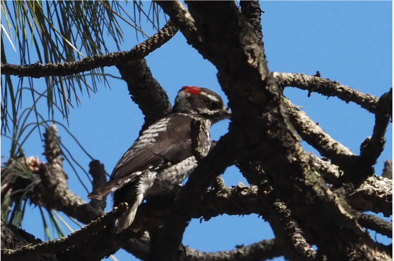
Strickland's Woodpecker