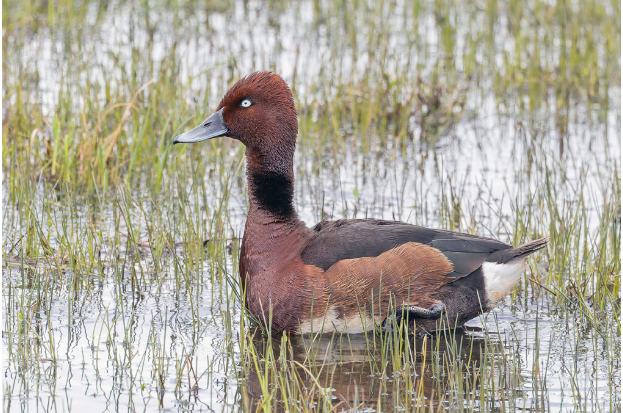
Ferruginous Duck