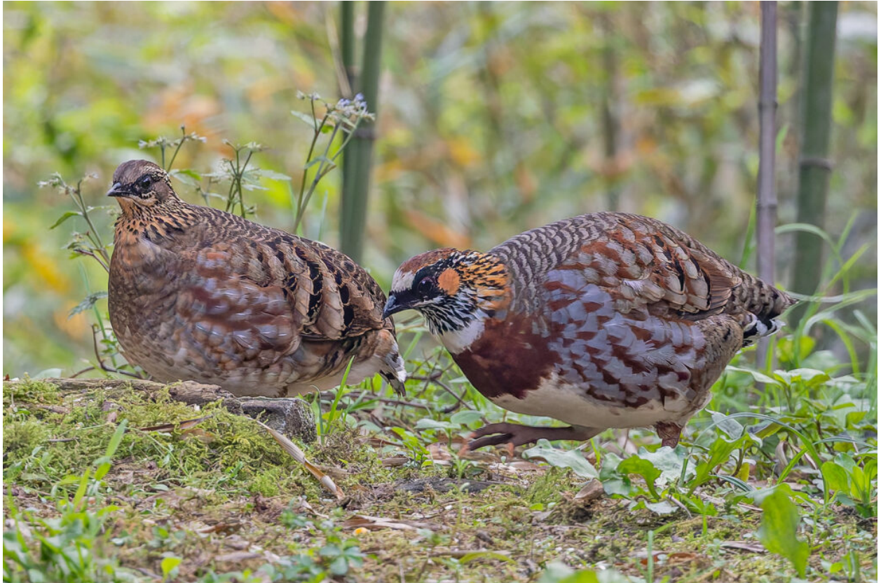
Sichuan Partridge