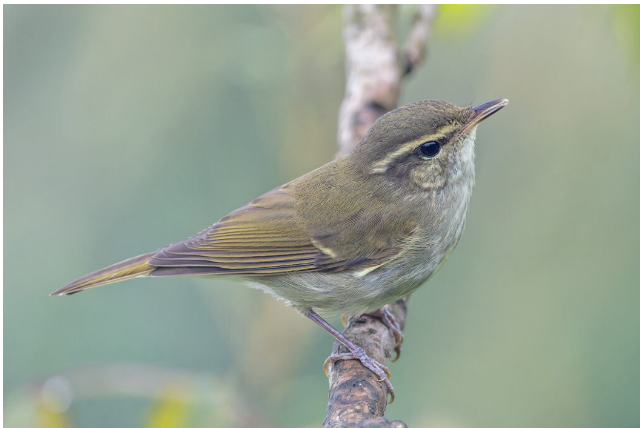
Large-billed Leaf Warbler