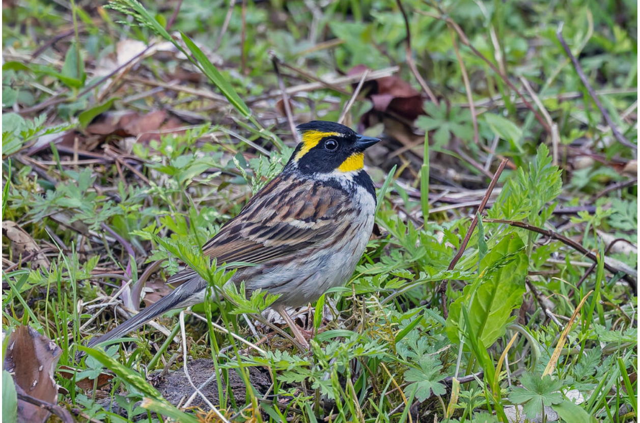
Yellow-throated Bunting