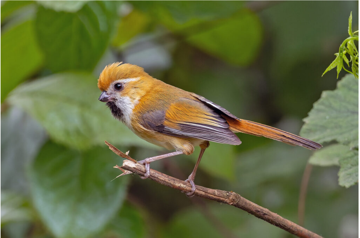
Golden Parrotbill