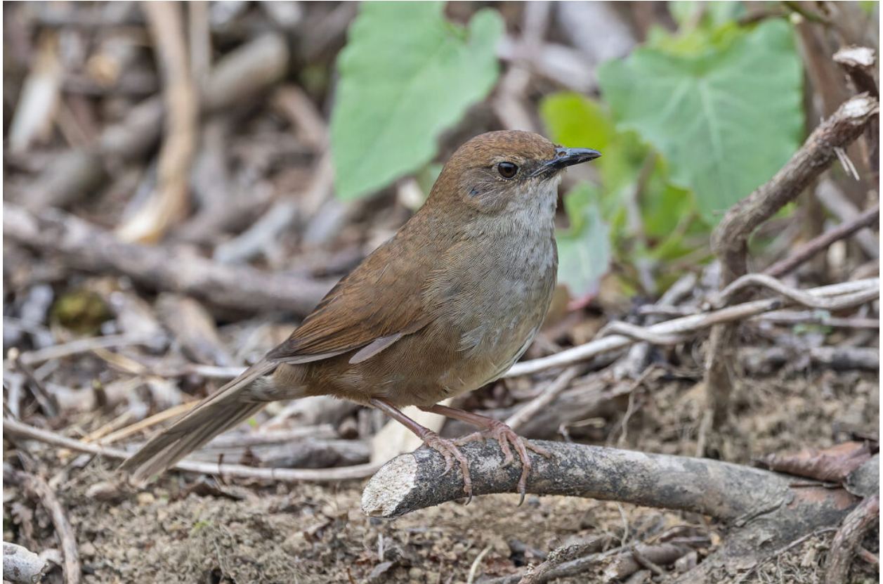
Sichuan Bush Warbler