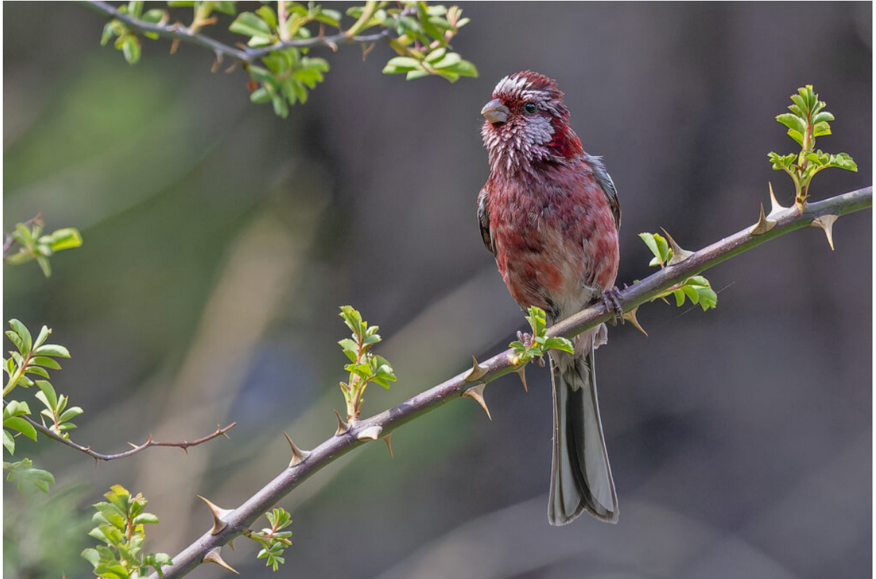
Long-tailed Rosefinch