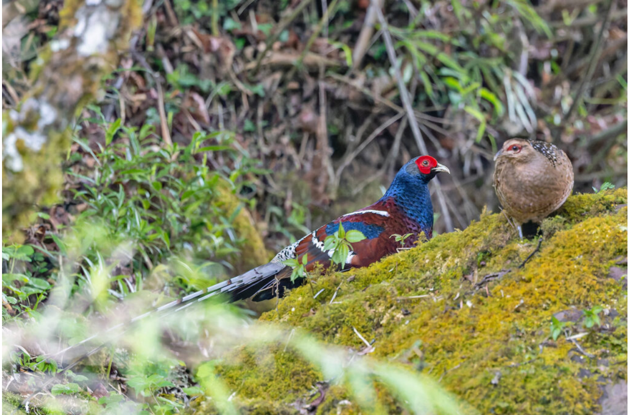
Mrs Hume's Pheasant