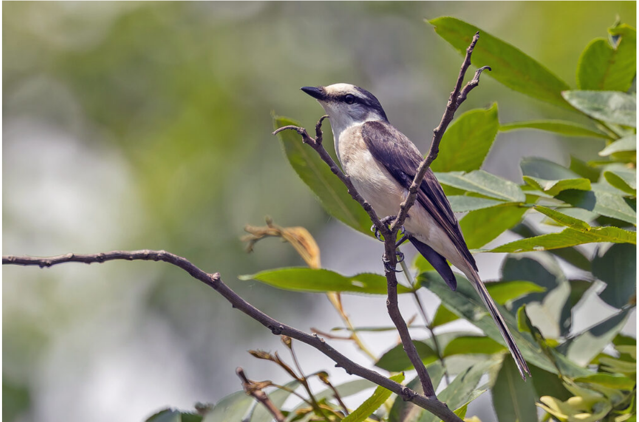
Swinhoe's Minivet