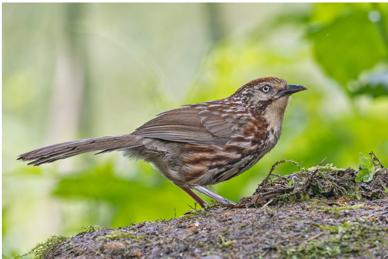
Chinese Babax