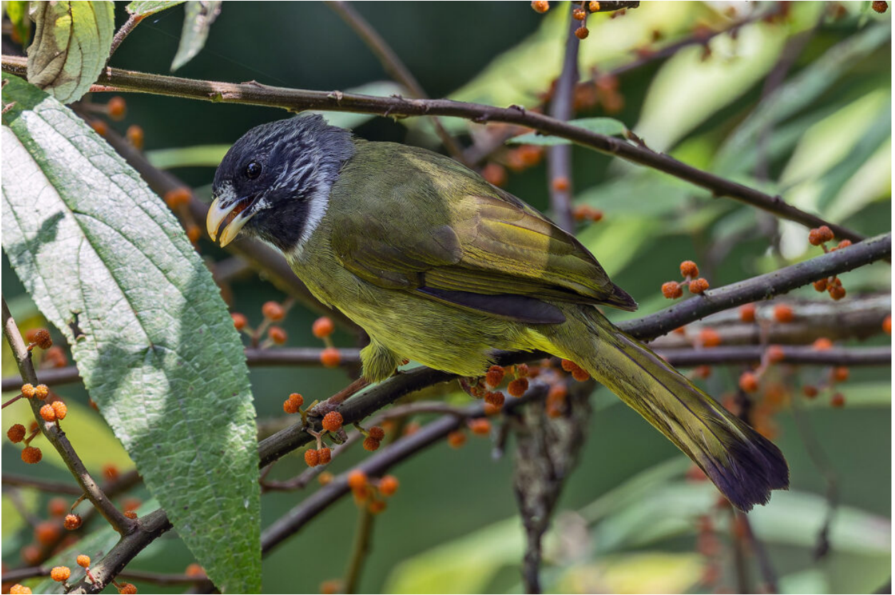
Collared Finchbill