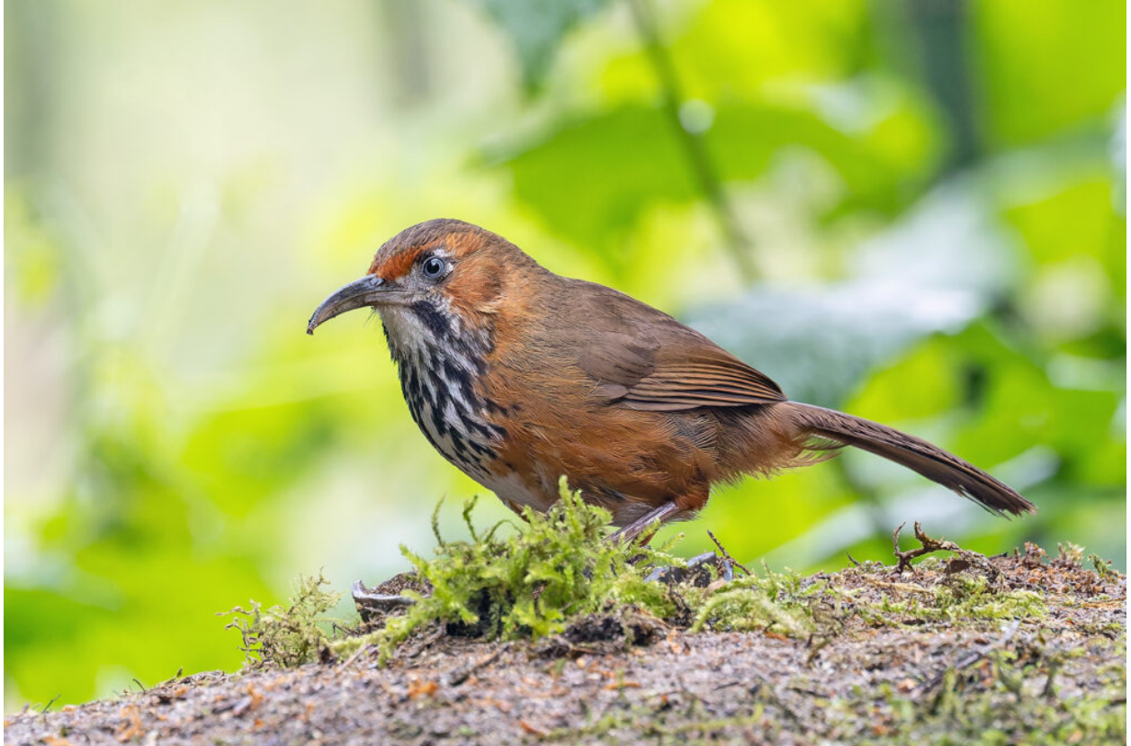
Black-streaked Scimitar Babbler