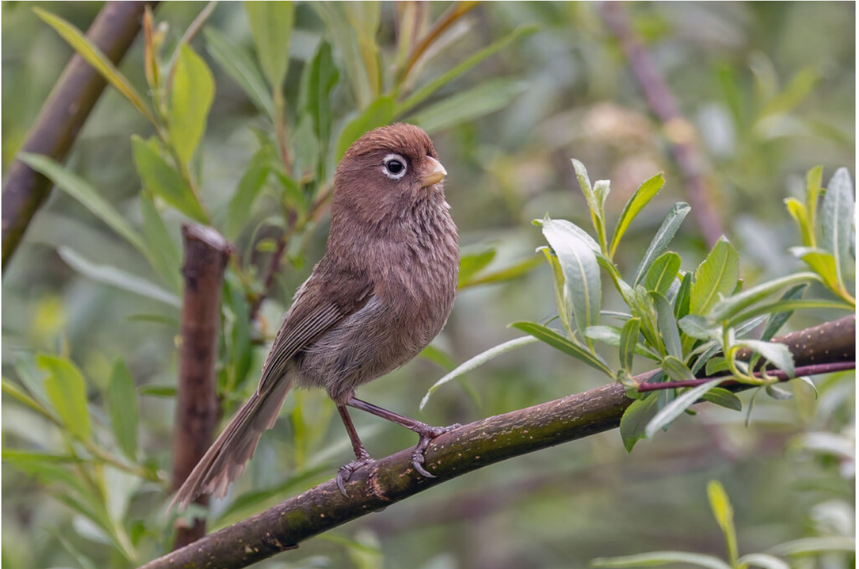
Spectacled Parrotbill