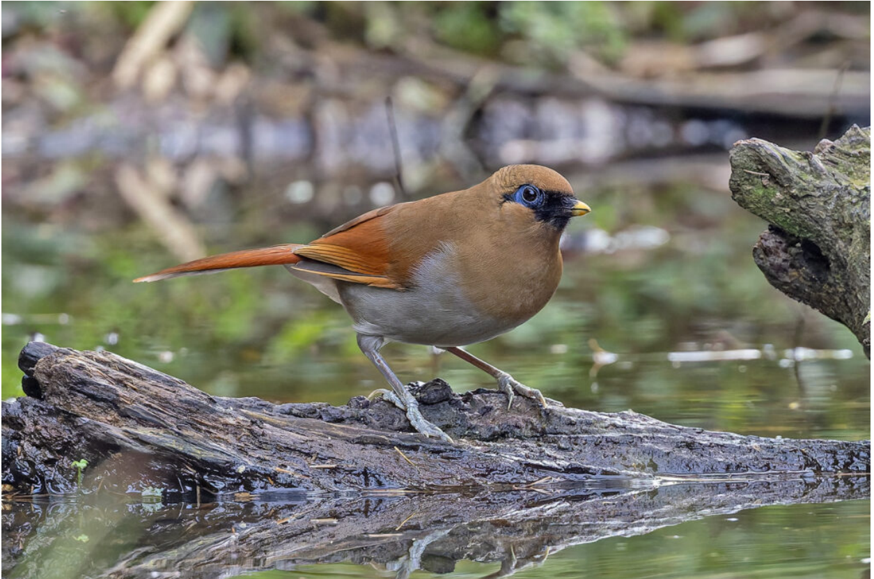
Buffy Laughingthrush