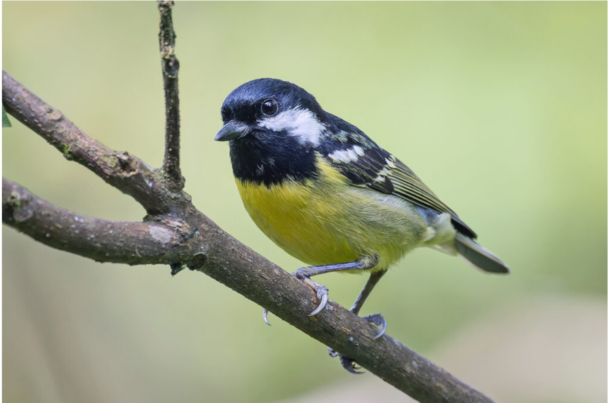
Yellow-bellied Tit