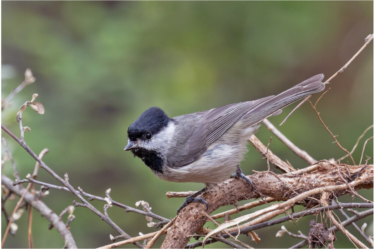
Black-bibbed Tit