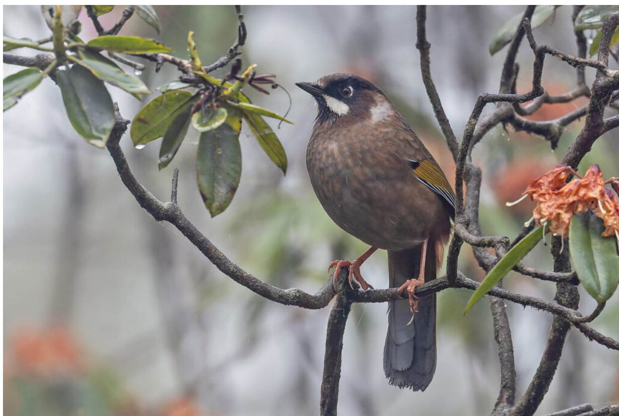
Black-faced Laughingthrush