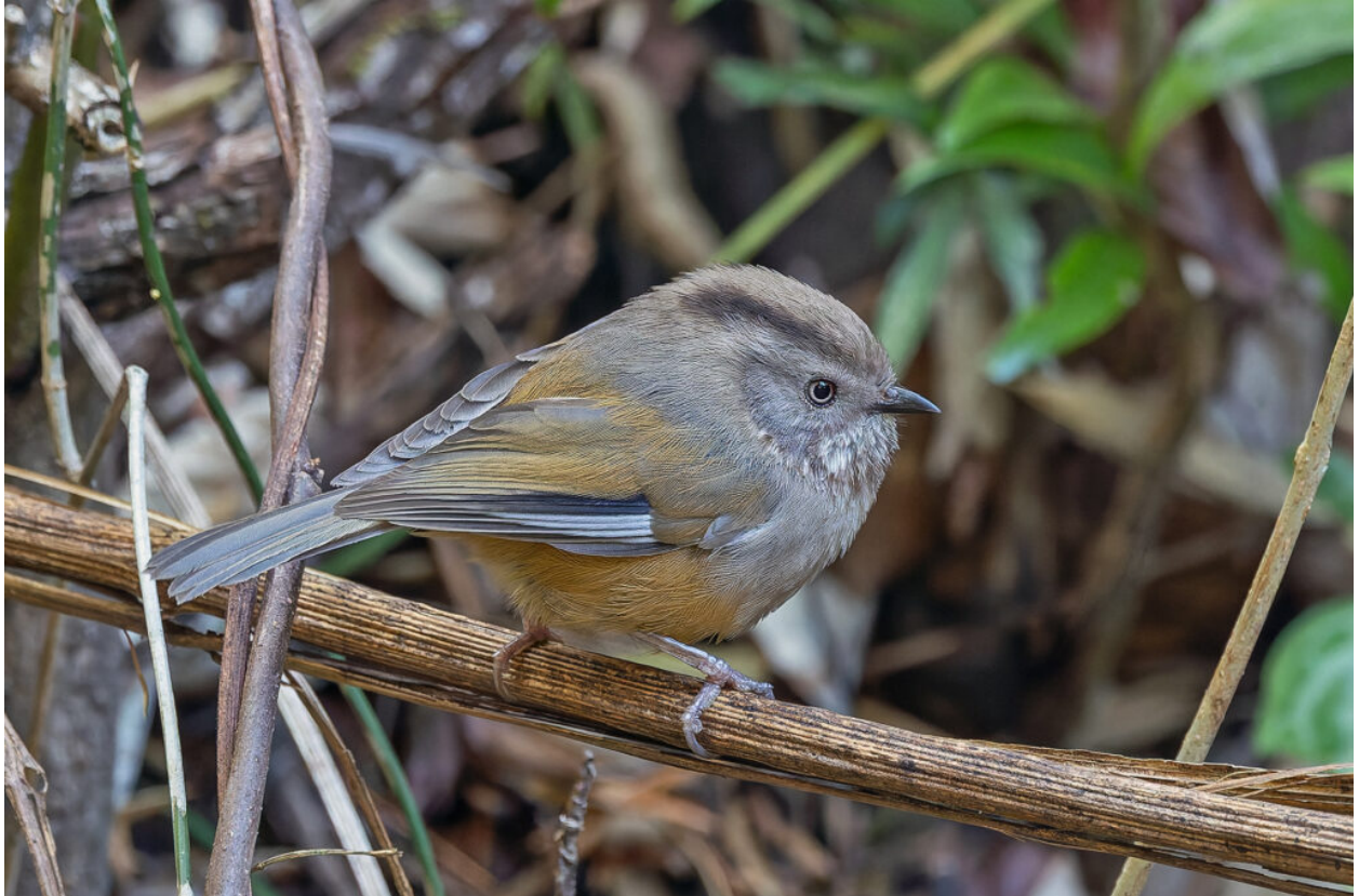
Manipur Fulvetta