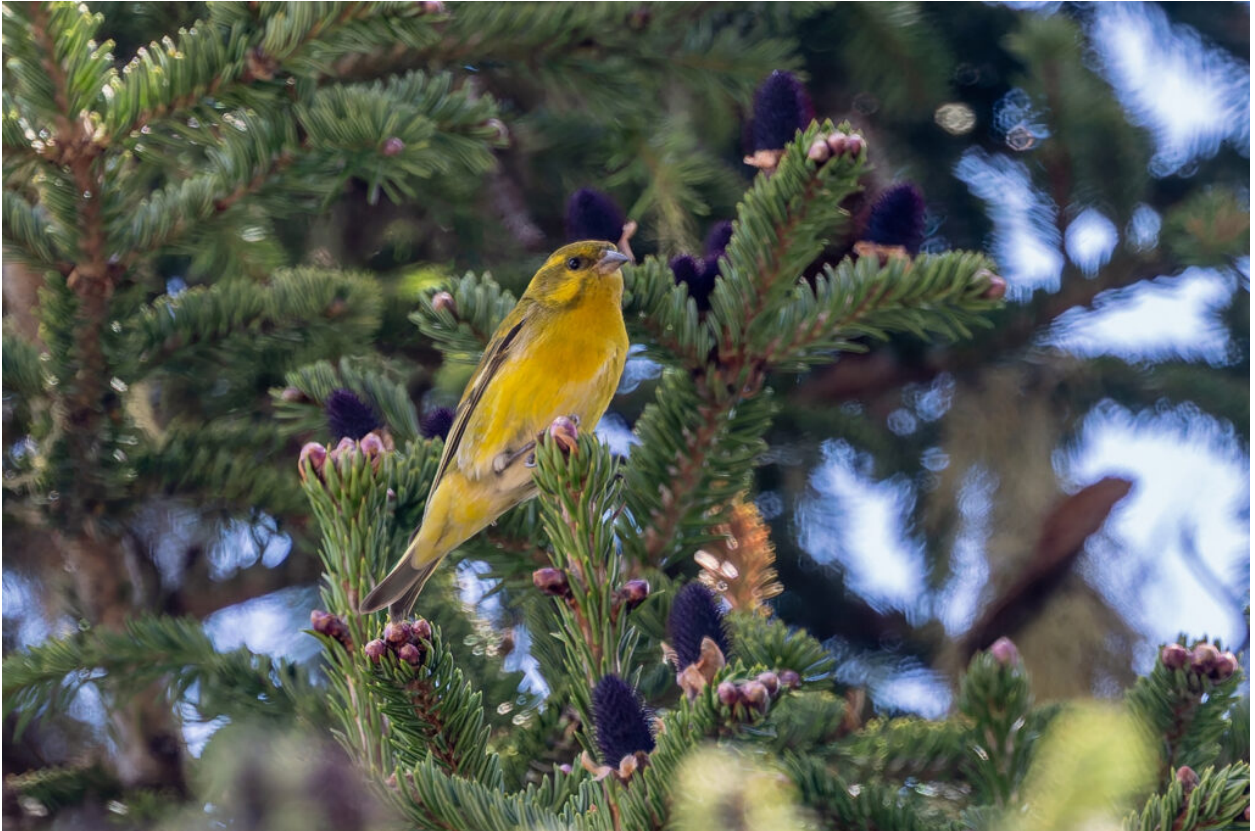
Tibetan Serin