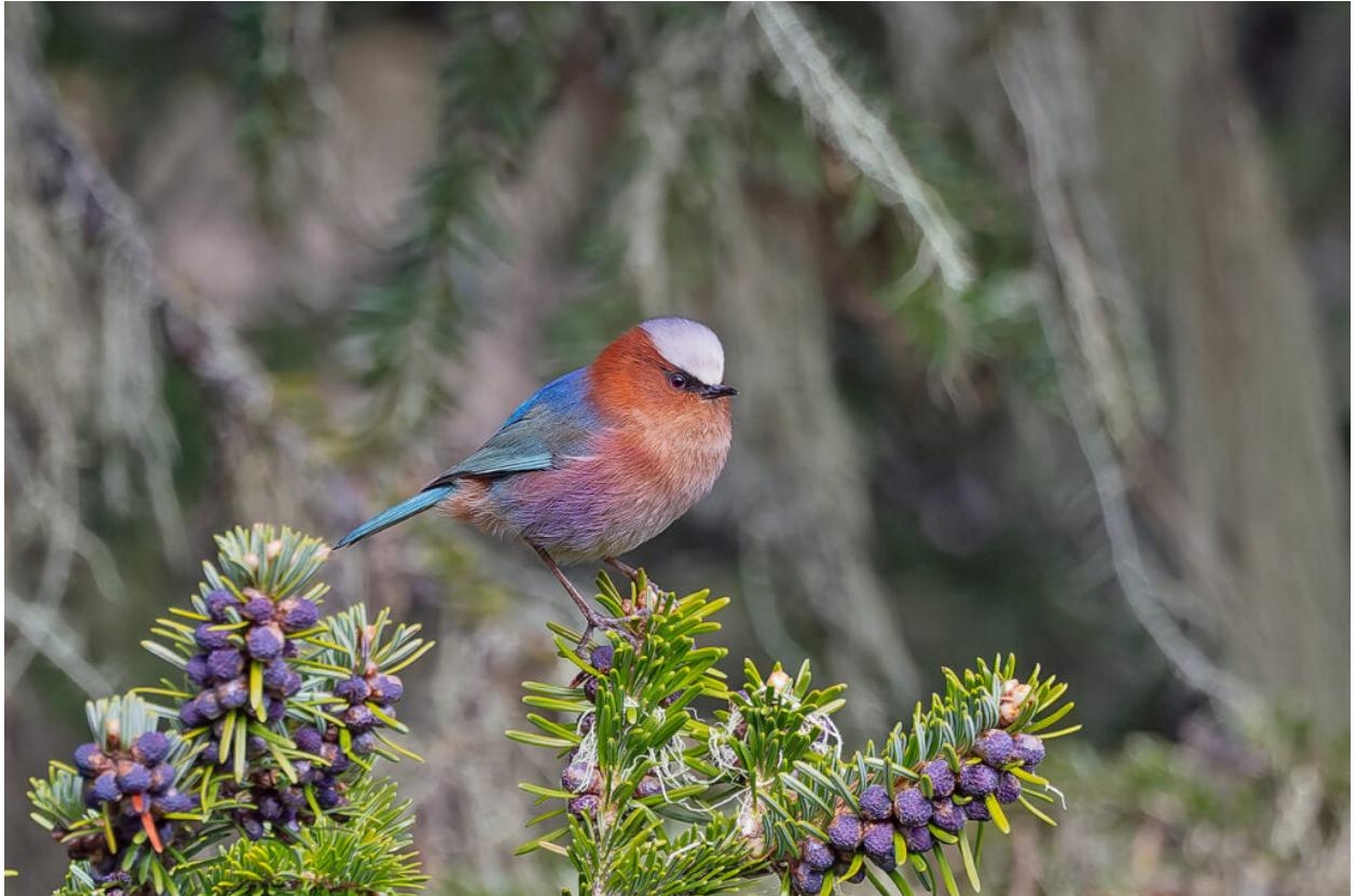
Crested Tit-Warbler