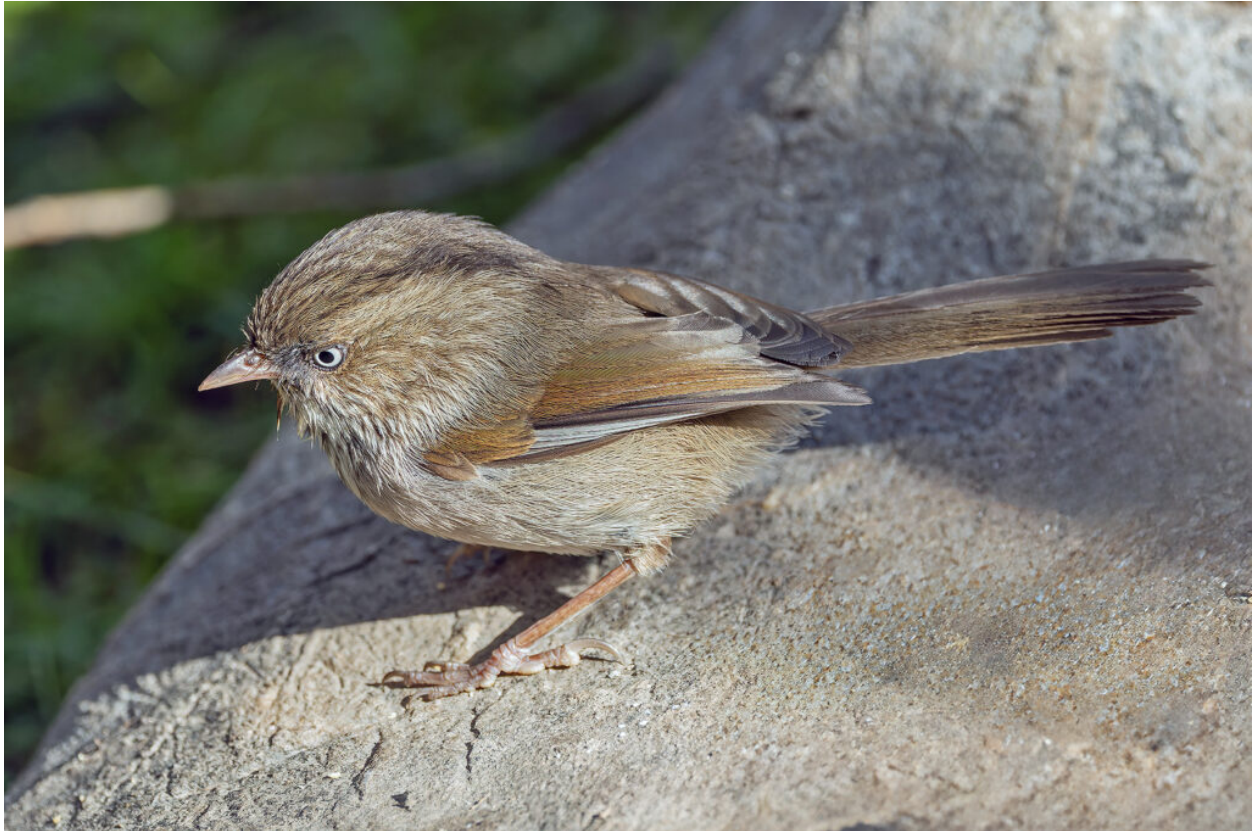
Chinese Fulvetta