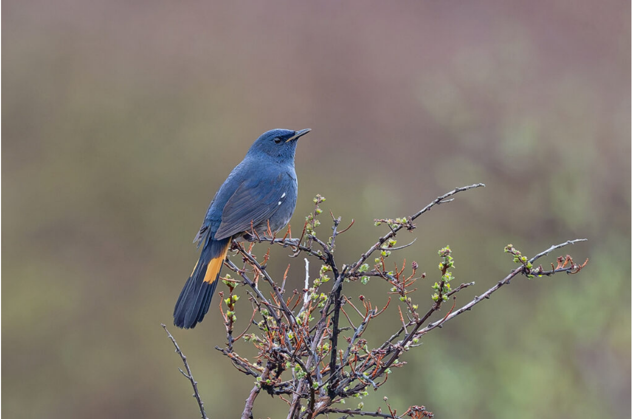
White-bellied Redstart