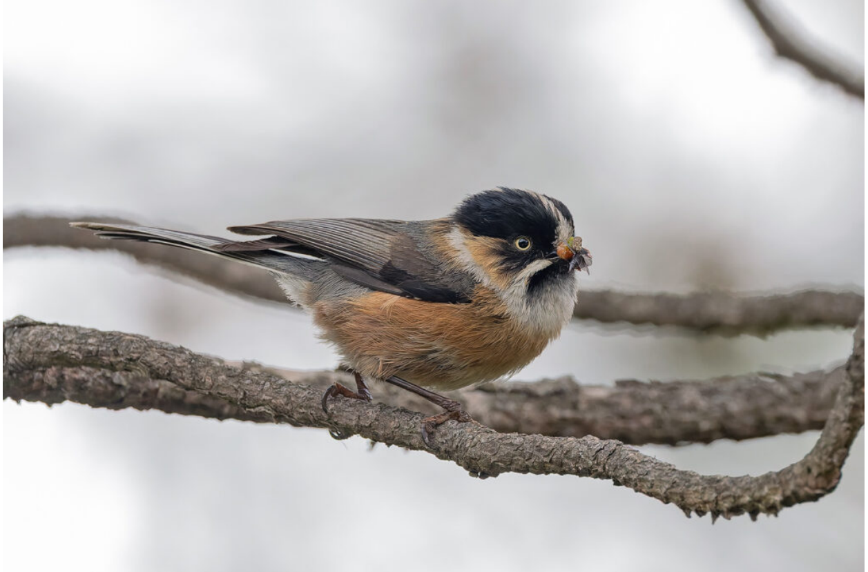
Black-browed Bushtit