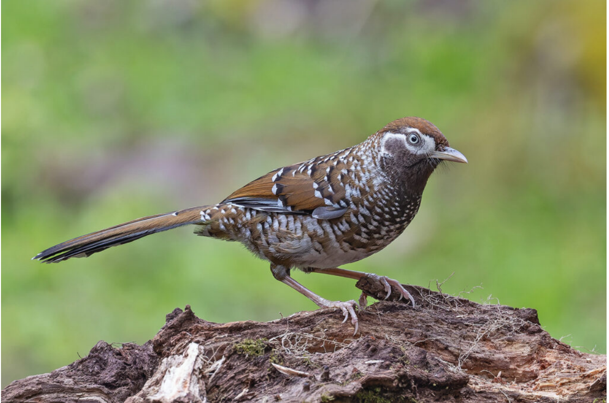
White-speckled Laughingthrush