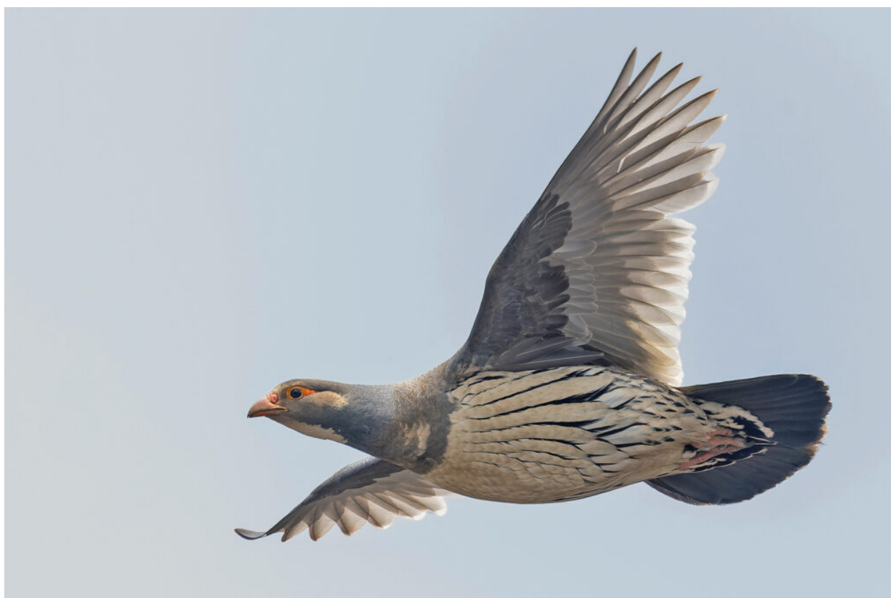
Tibetan Snowcock