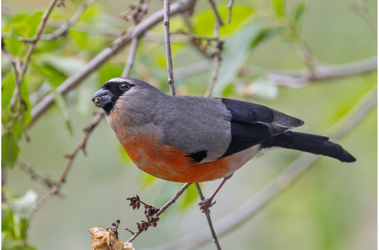
Grey-headed Bullfinch