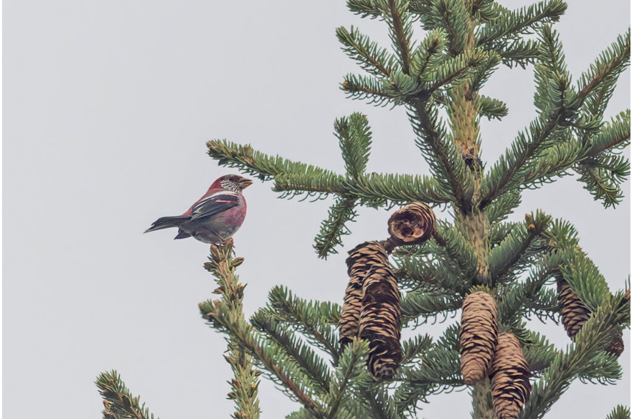
Three-banded Rosefinch