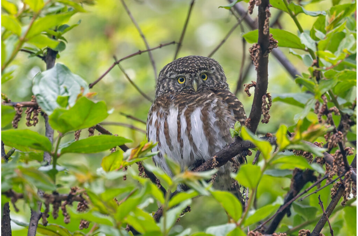
Collared Owlet