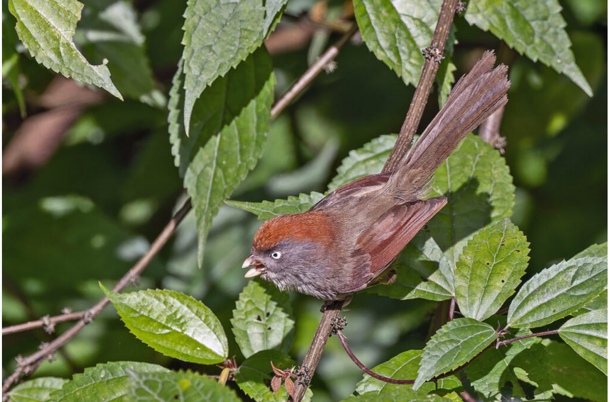
Ashy-throated Parrotbill