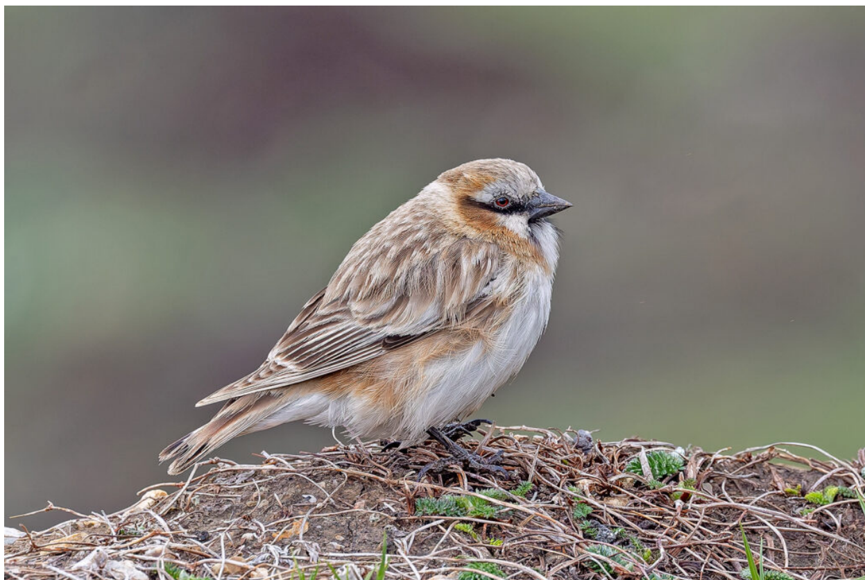
Rufous-necked Snowfinch