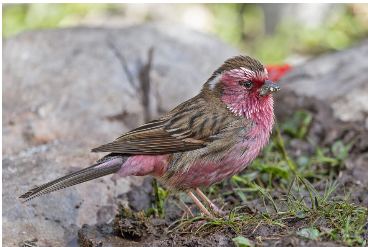
Chinese White-browed Rosefinch