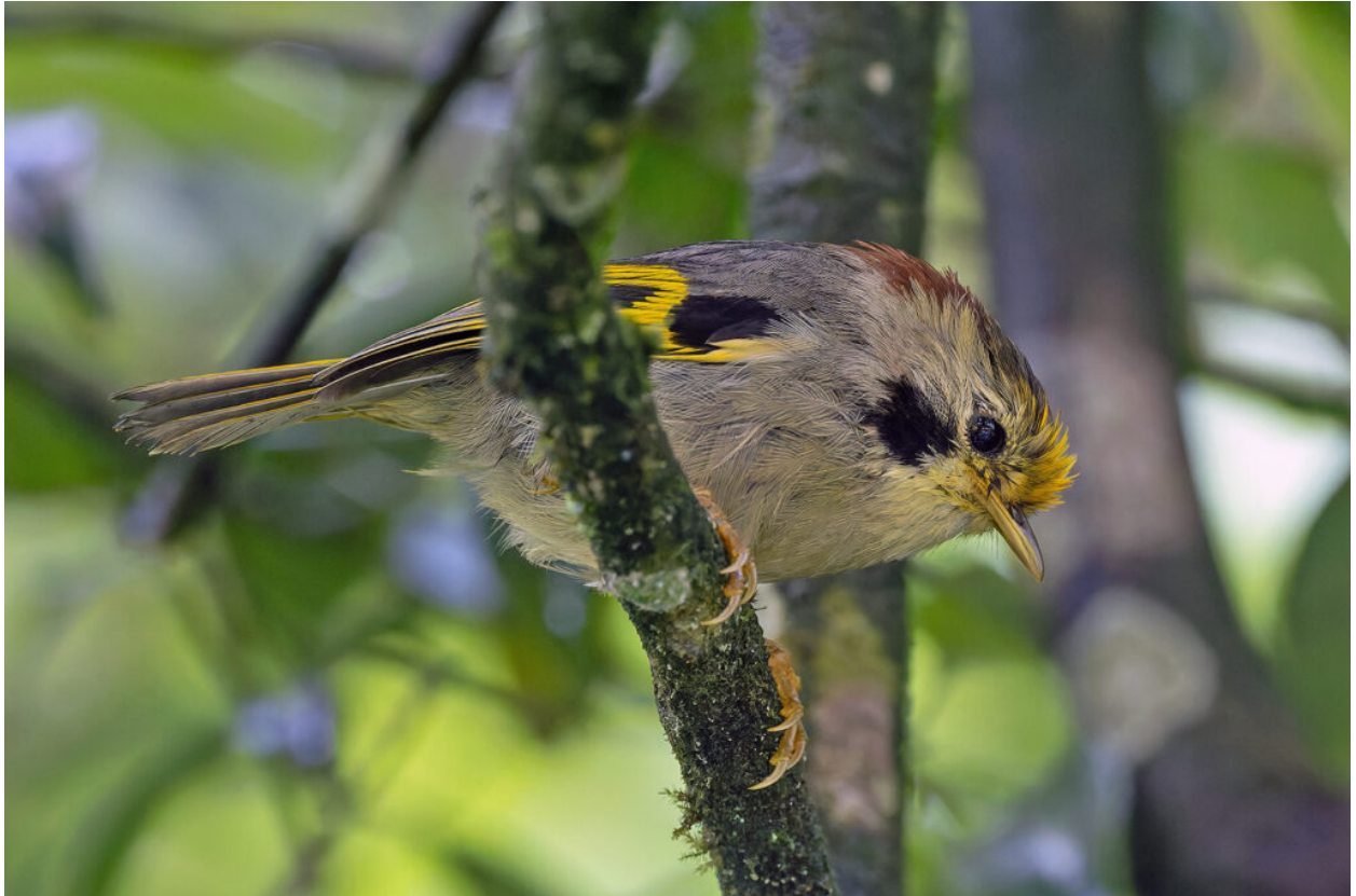
Golden-fronted Fulvetta