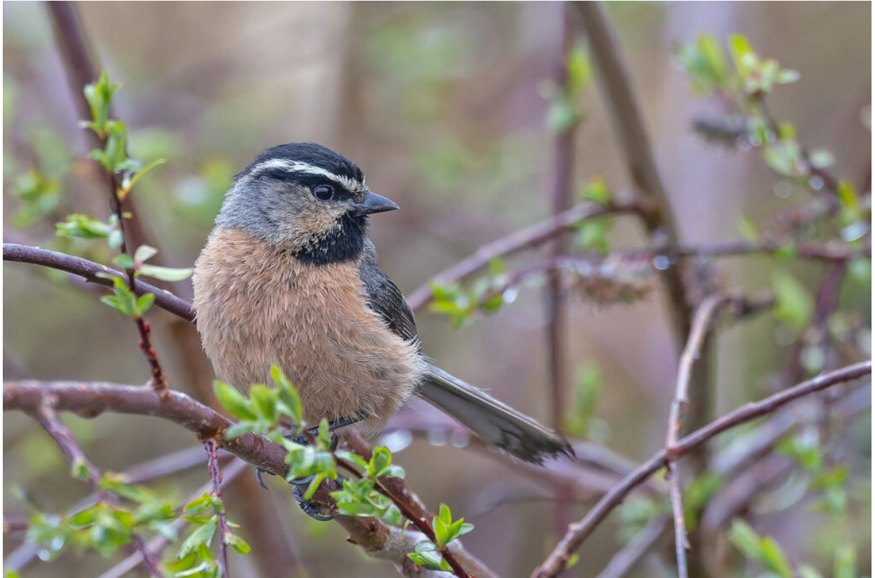
White-browed Tit