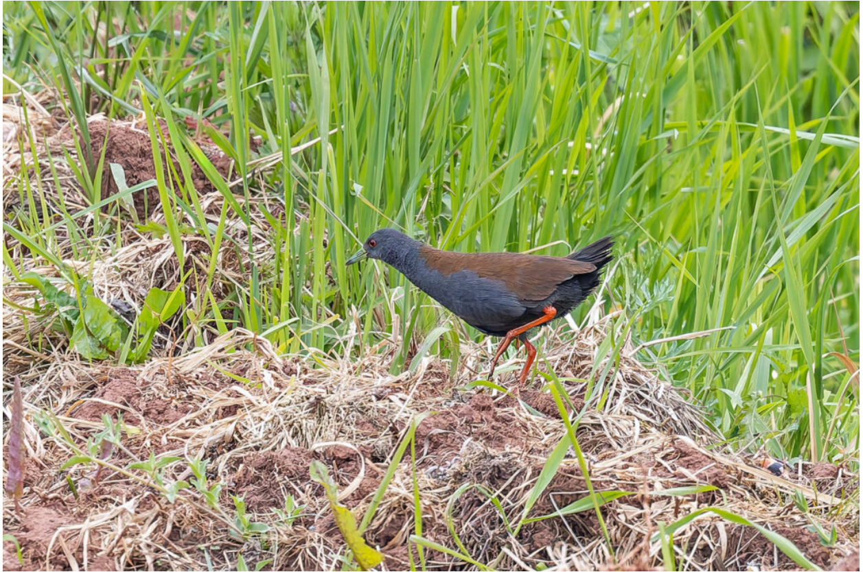
Black-tailed Crake