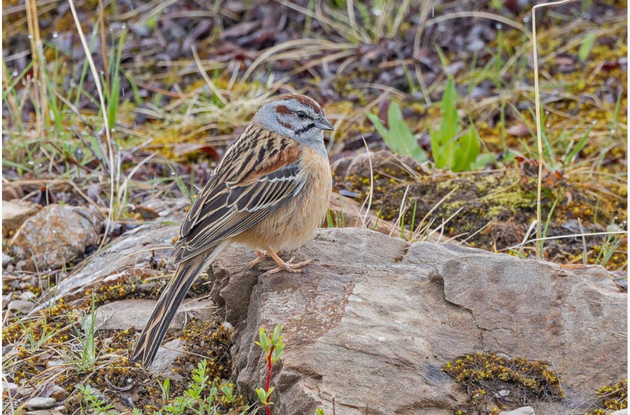
Godlewski's Bunting