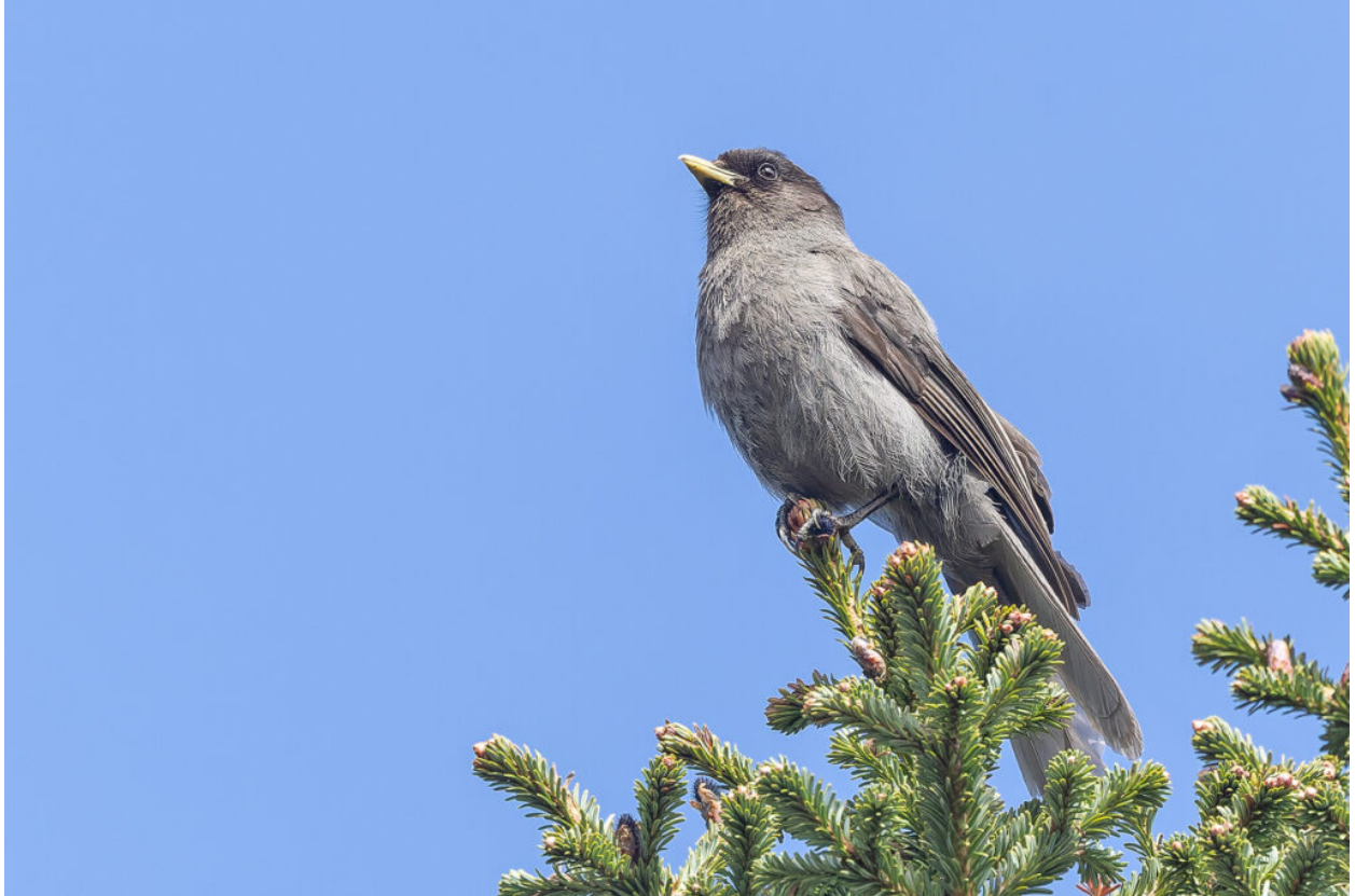
Sichuan Jay