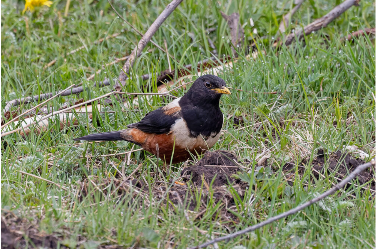
White-backed Thrush