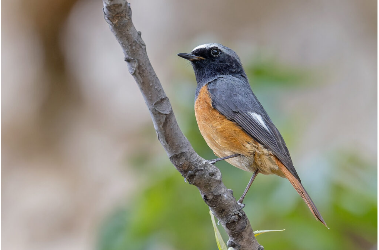
Hodgson's Redstart