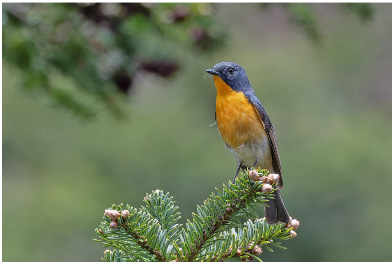
Slaty-backed Flycatcher