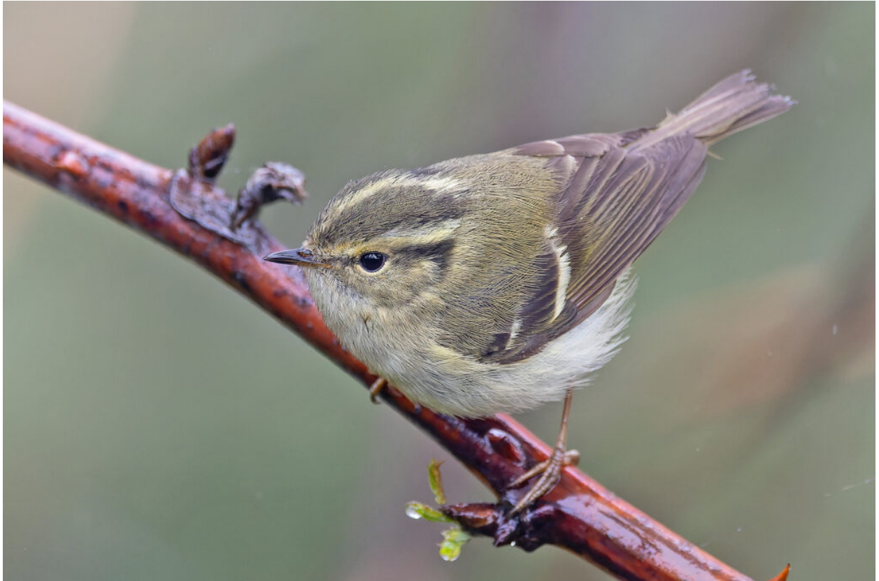
Sichuan Leaf Warbler