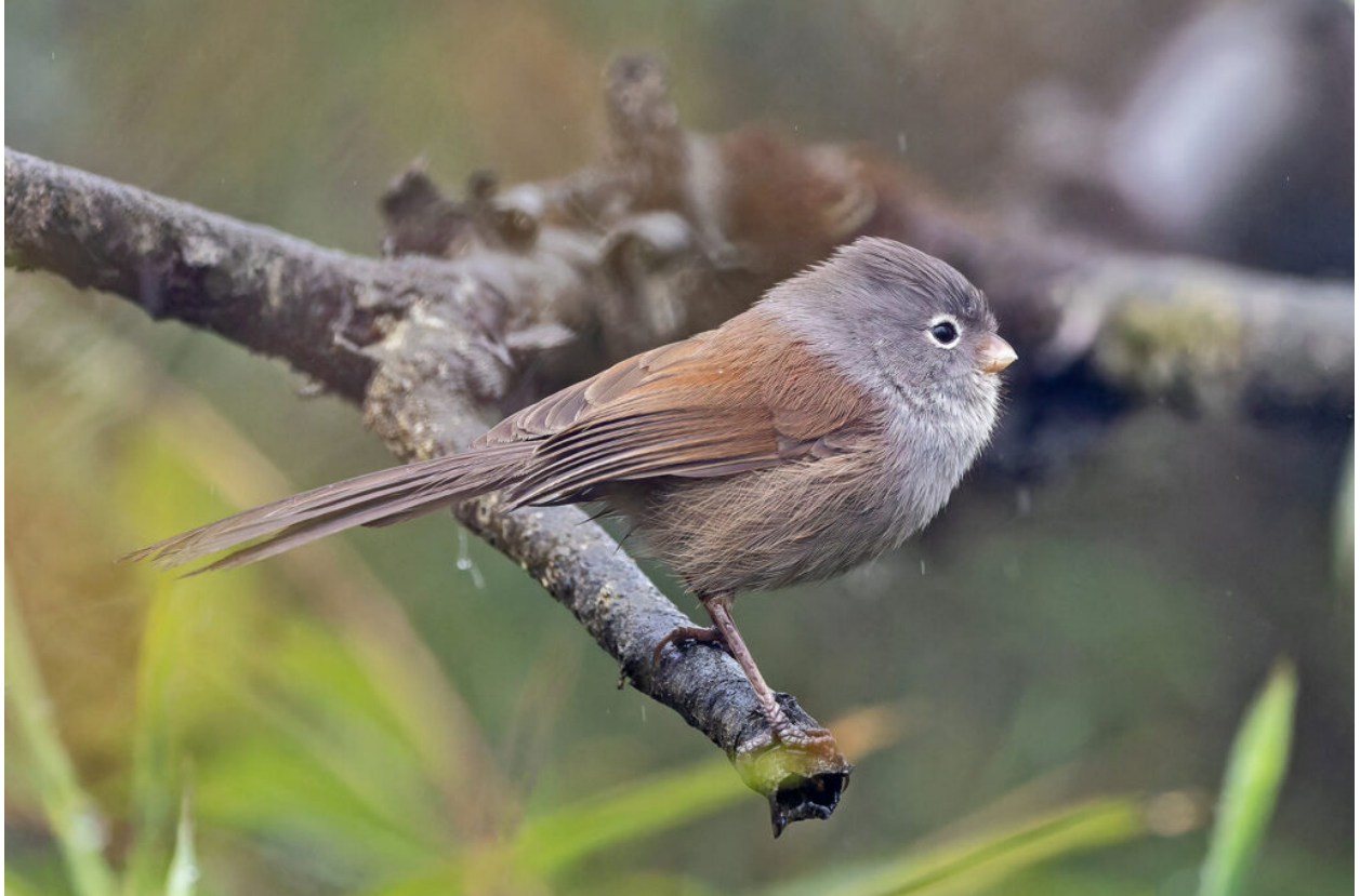
Grey-hooded Parrotbill