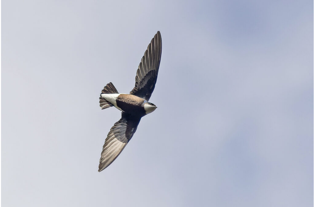
White-throated Needletail