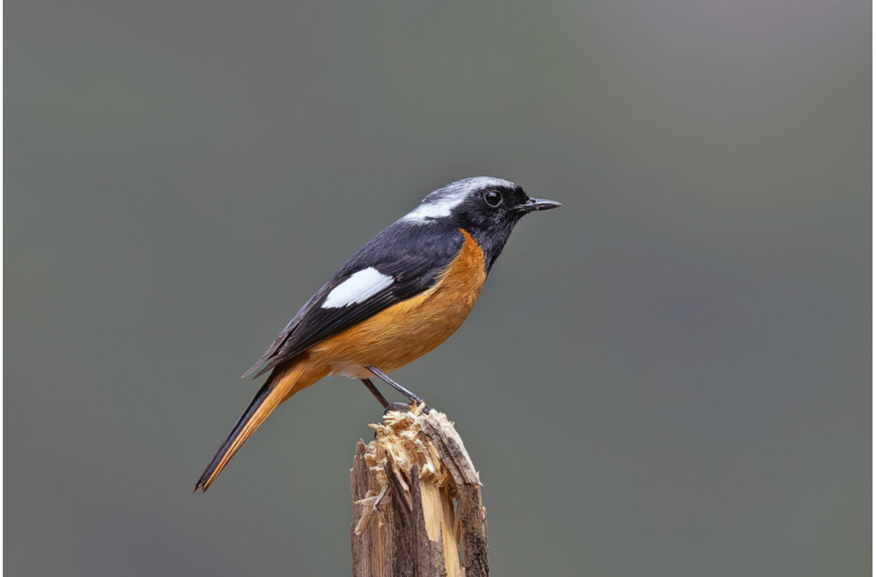
Daurian Redstart