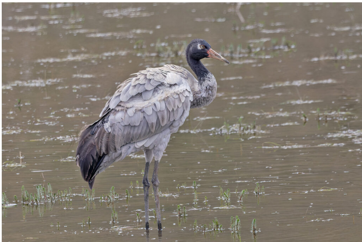
Black-necked Crane