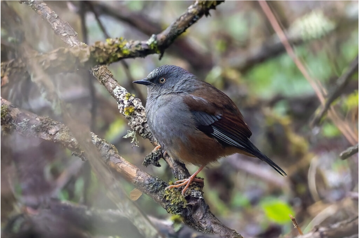
Maroon-backed Accentor