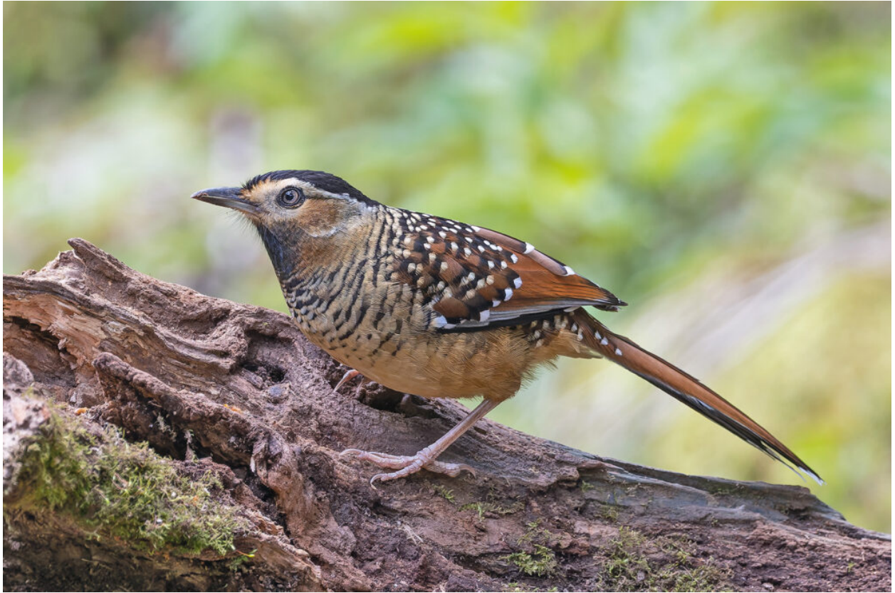
Spotted Laughingthrush