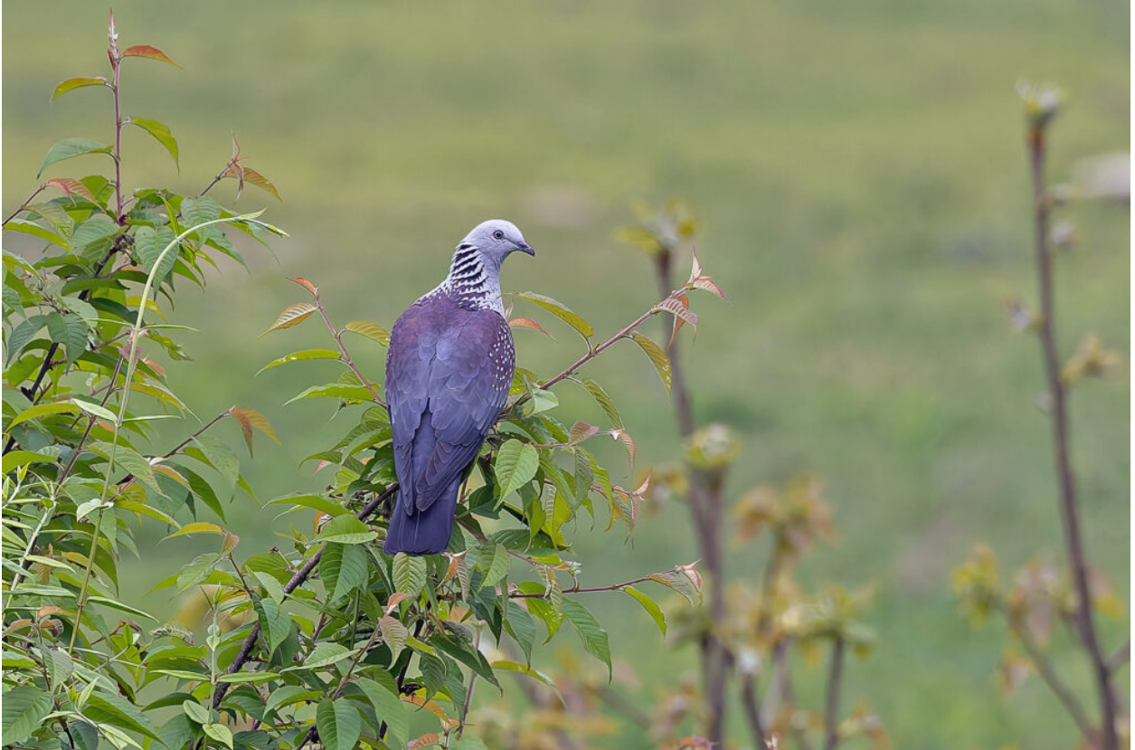
Speckled Woodpigeon