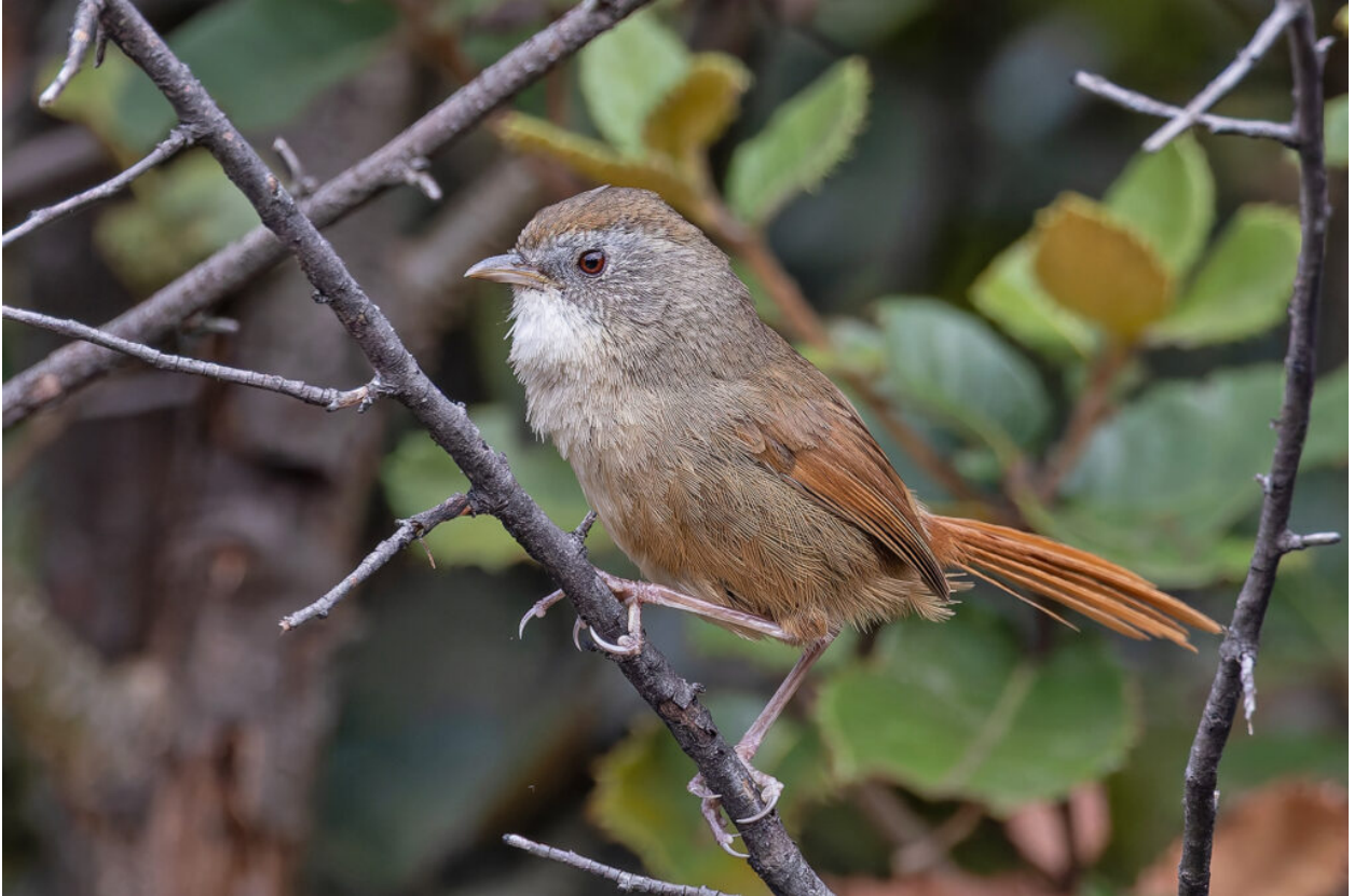
Rufous-tailed Babbler