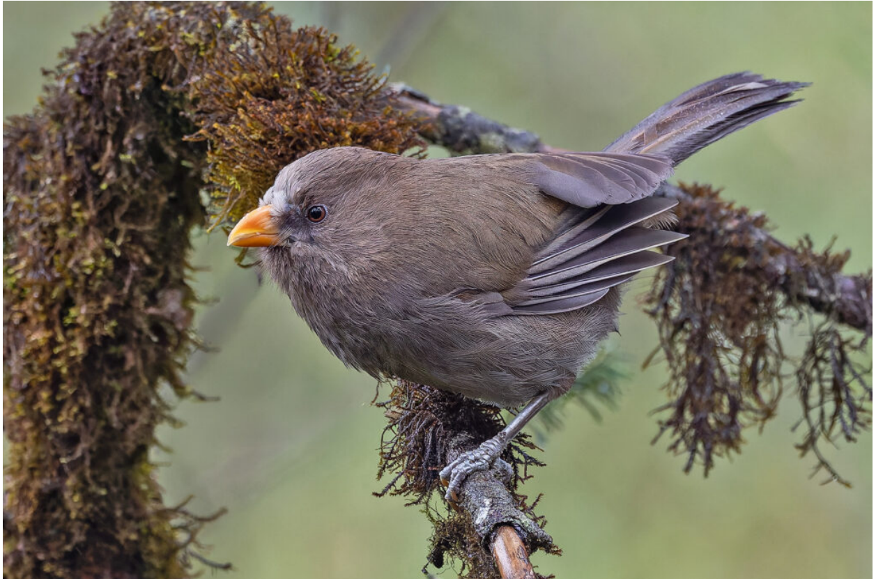
Great Parrotbill