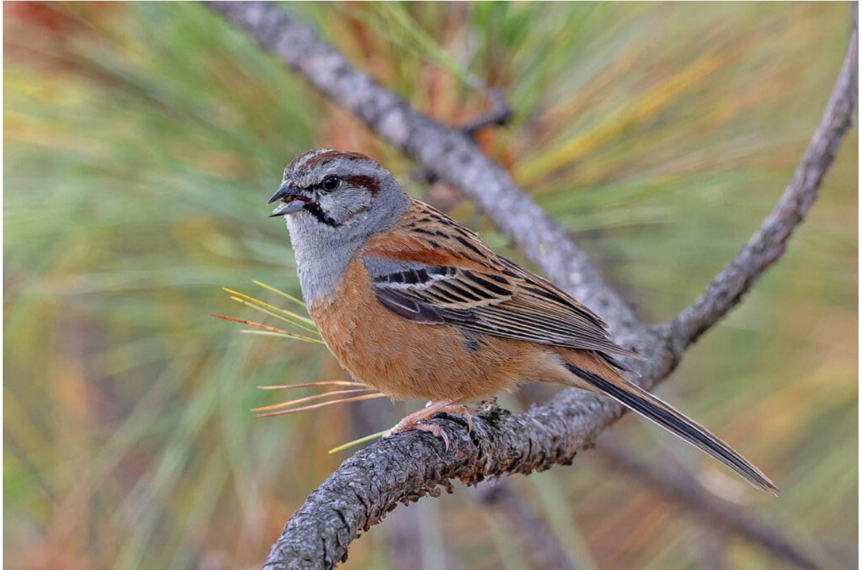
Godlewski's Bunting (Yunnan)