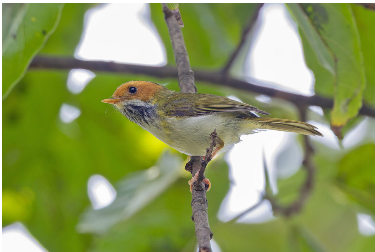
Rufous-faced Warbler