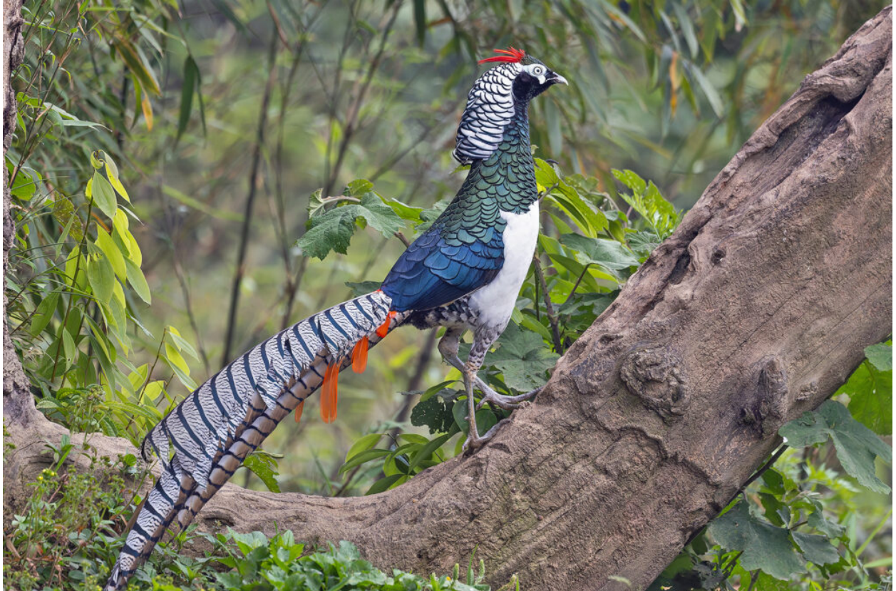
Lady Amherst's Pheasant