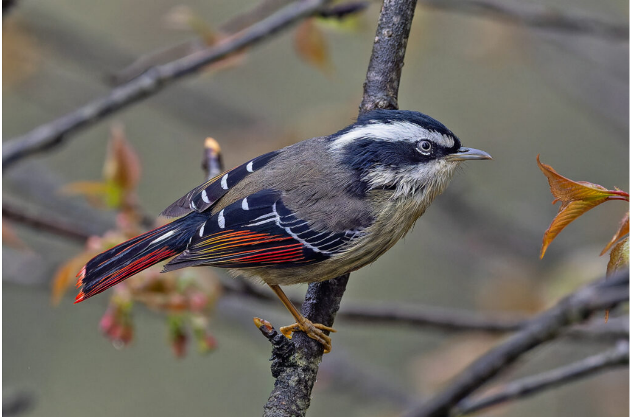
Red-tailed Minla