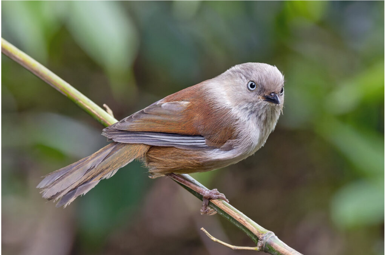
Grey-hooded Fulvetta