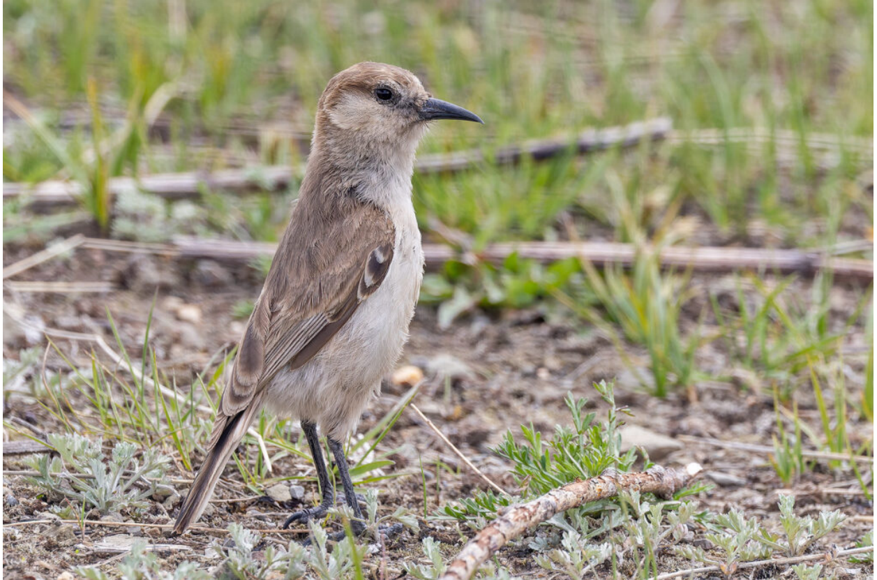
Ground Tit