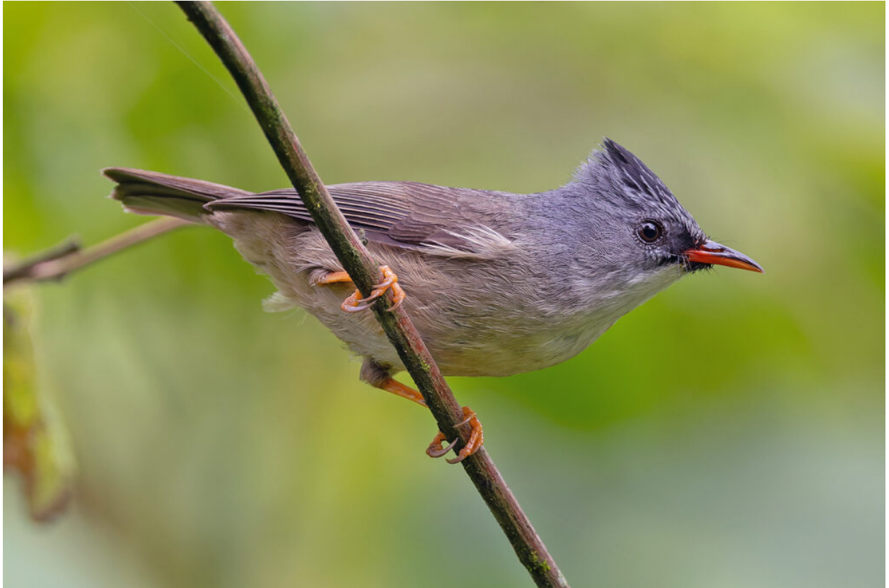
Black-chinned Yuhina