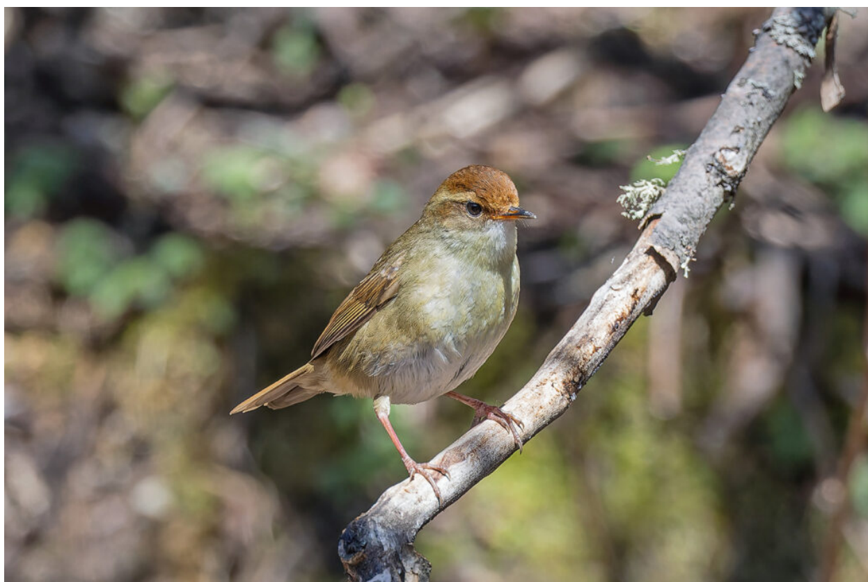
Chestnut-crowned Bush Warbler