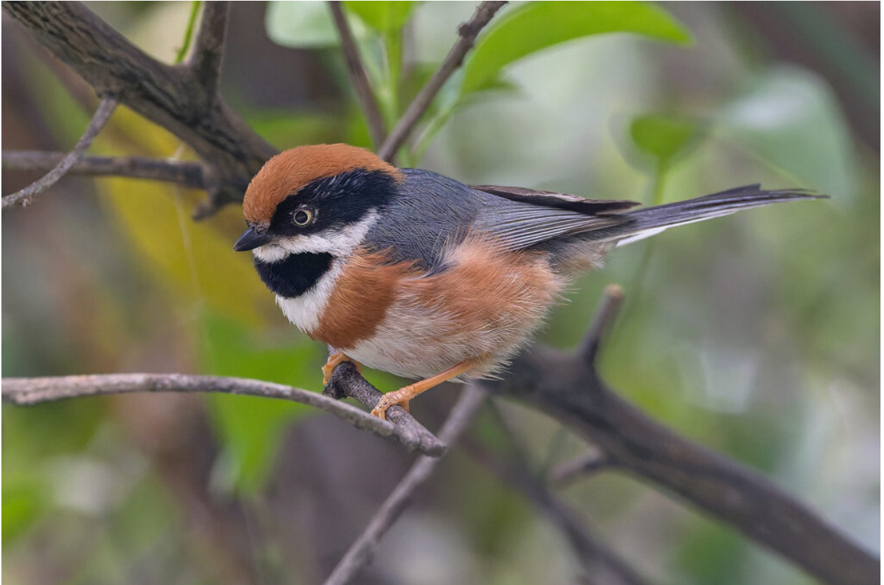
Black-throated Bushtit