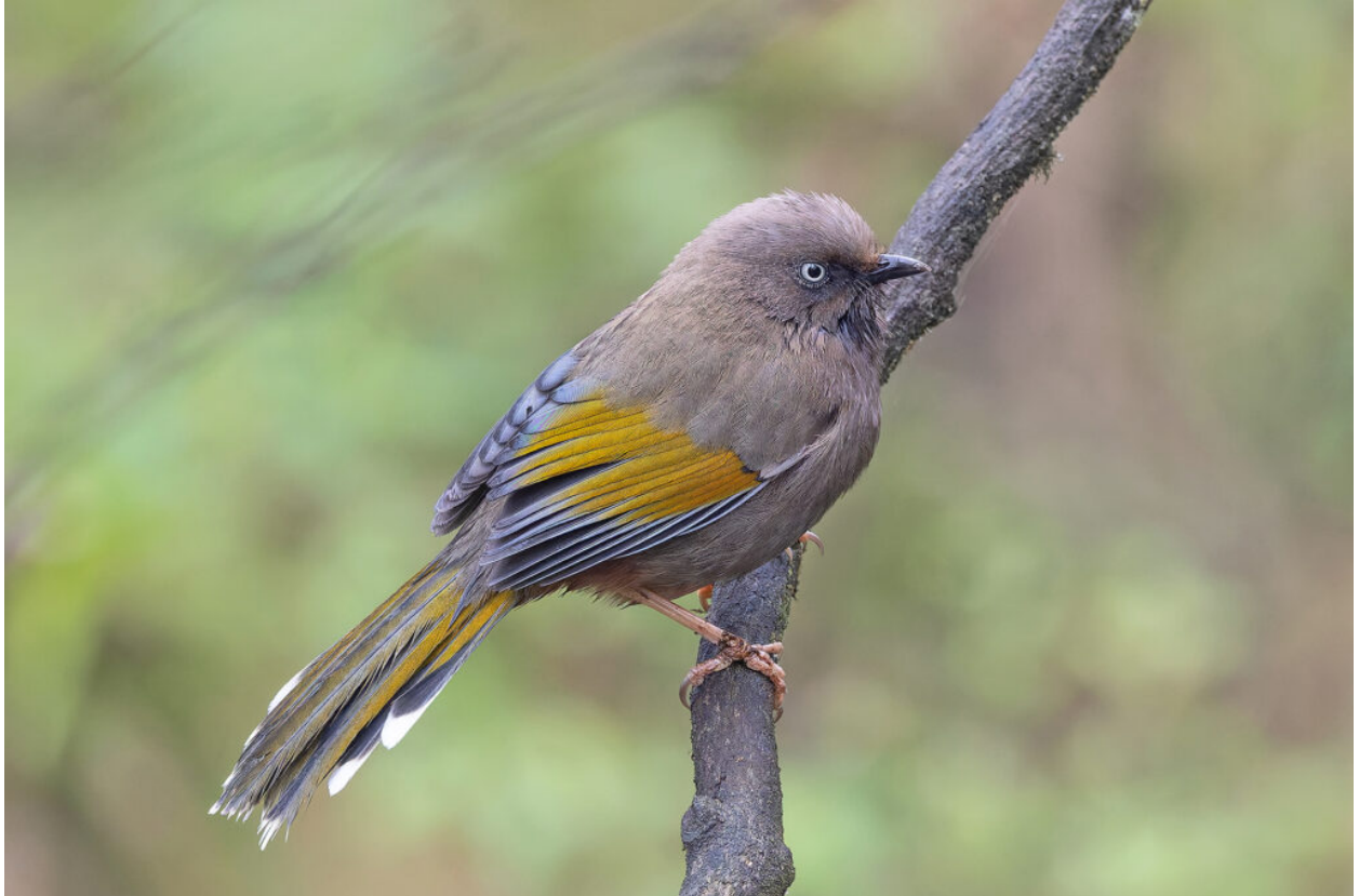
Elliot's Laughingthrush