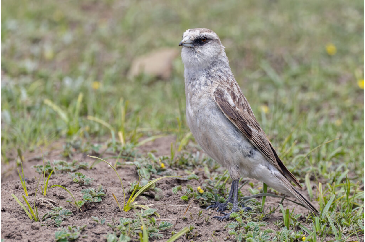
White-rumped Snowfinch