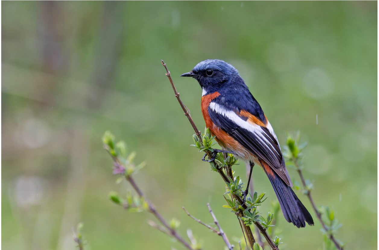
White-throated Redstart