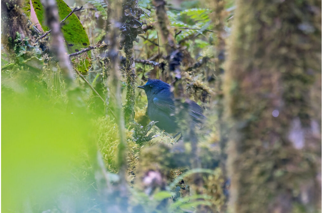
Blue-fronted Robin