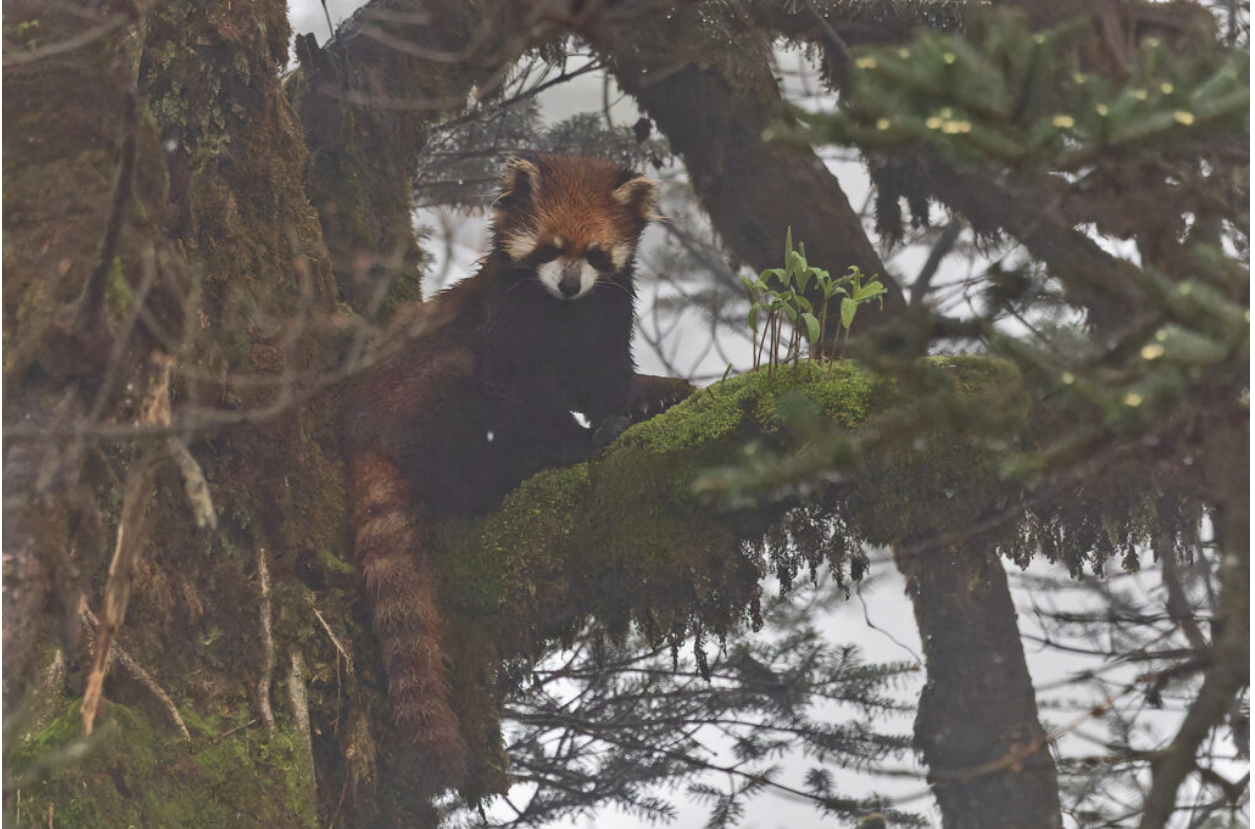
Red Panda