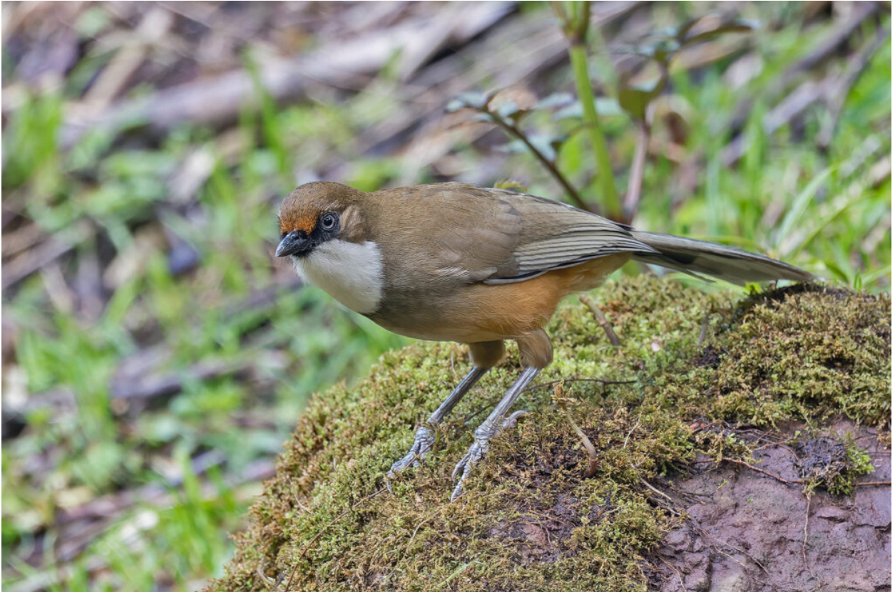
White-throated Laughingthrush