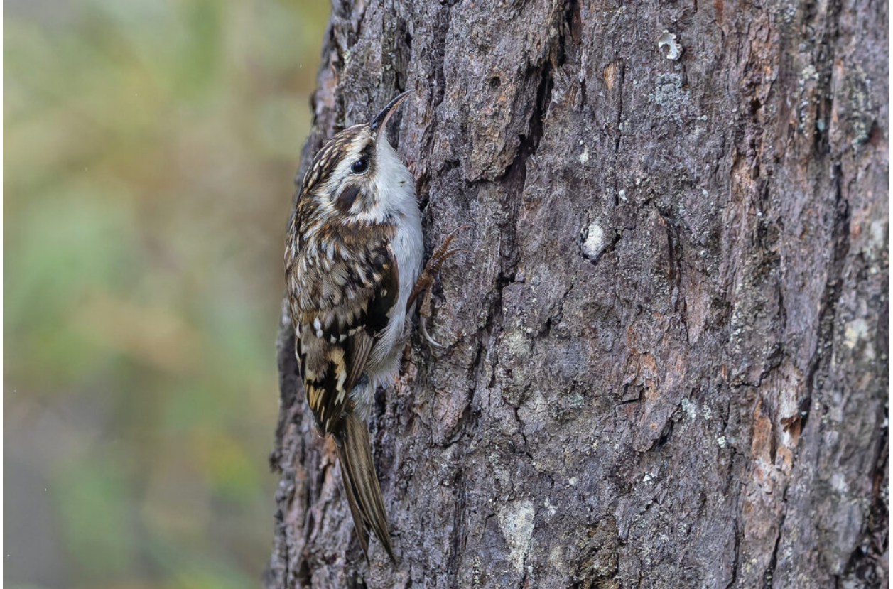
Hodgson's Treecreeper