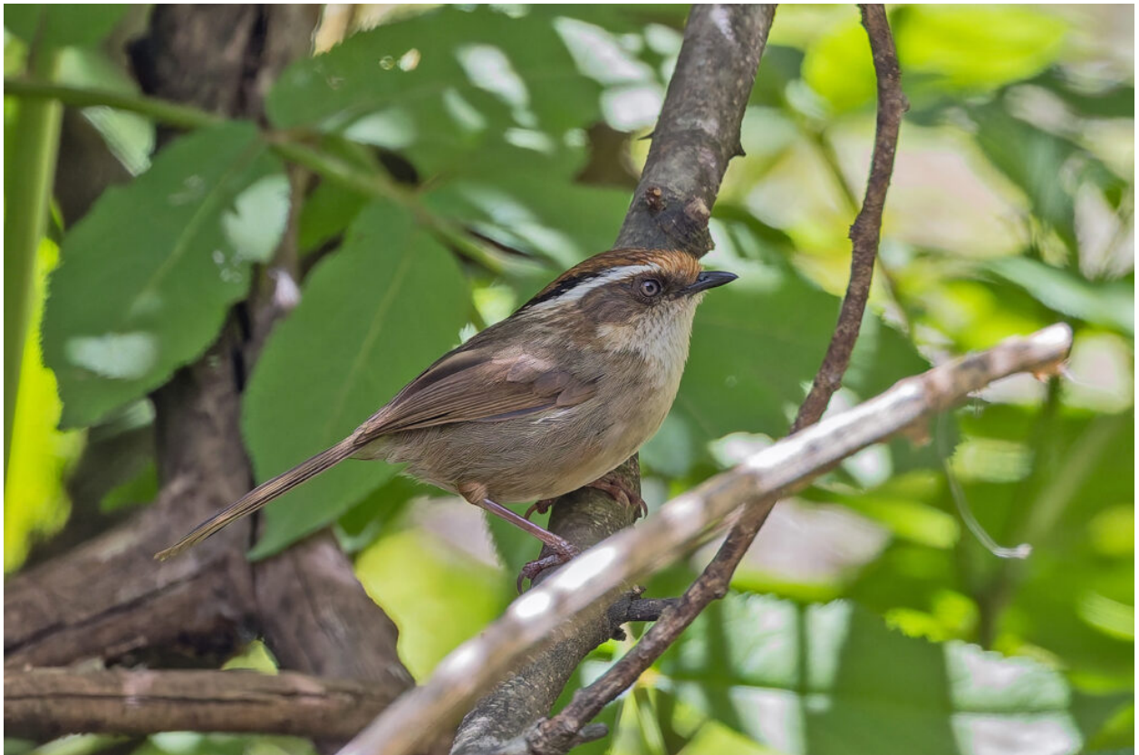
Rusty-capped Fulvetta