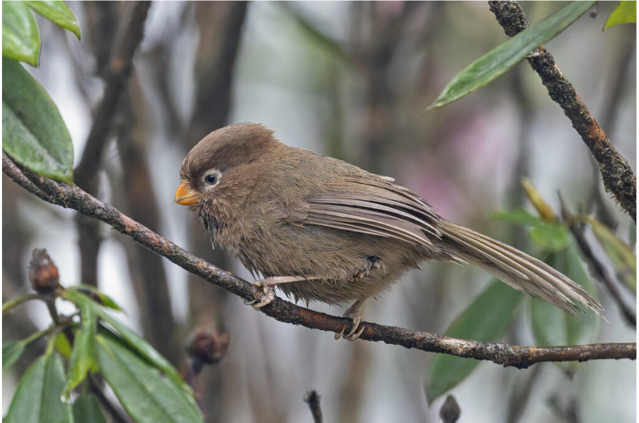
Three-toed Parrotbill