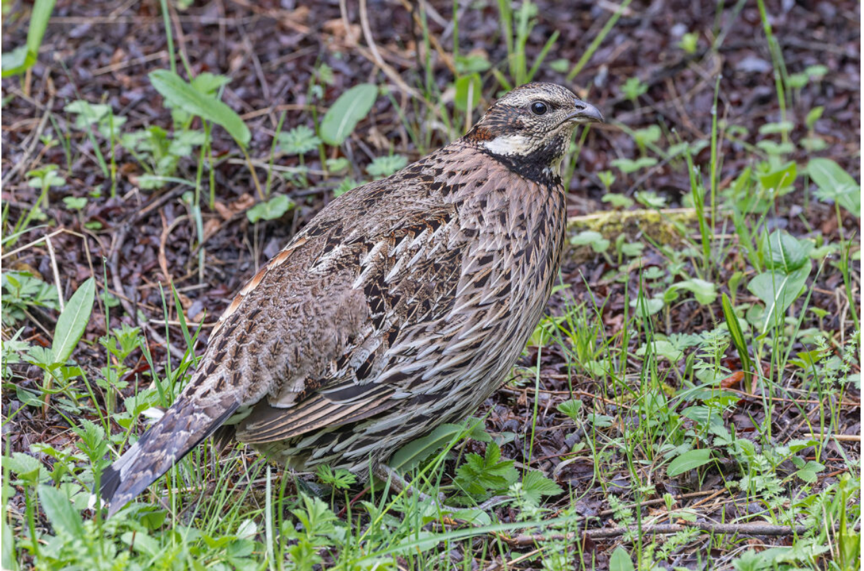
Koklass Pheasant