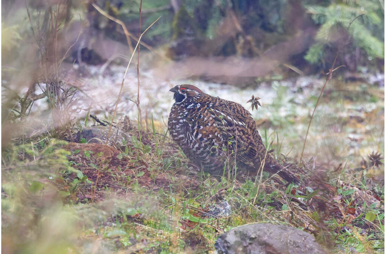
Chinese Grouse