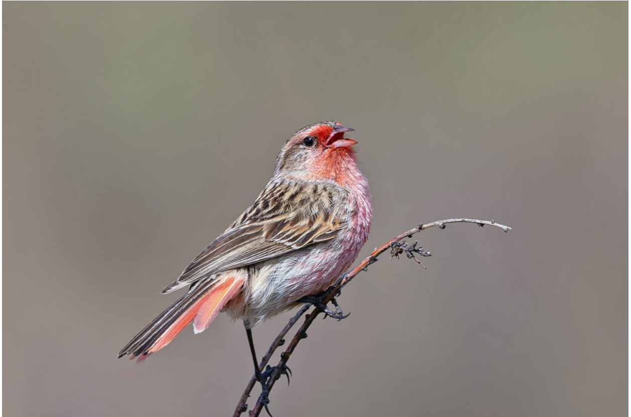
Przevalski's Finch