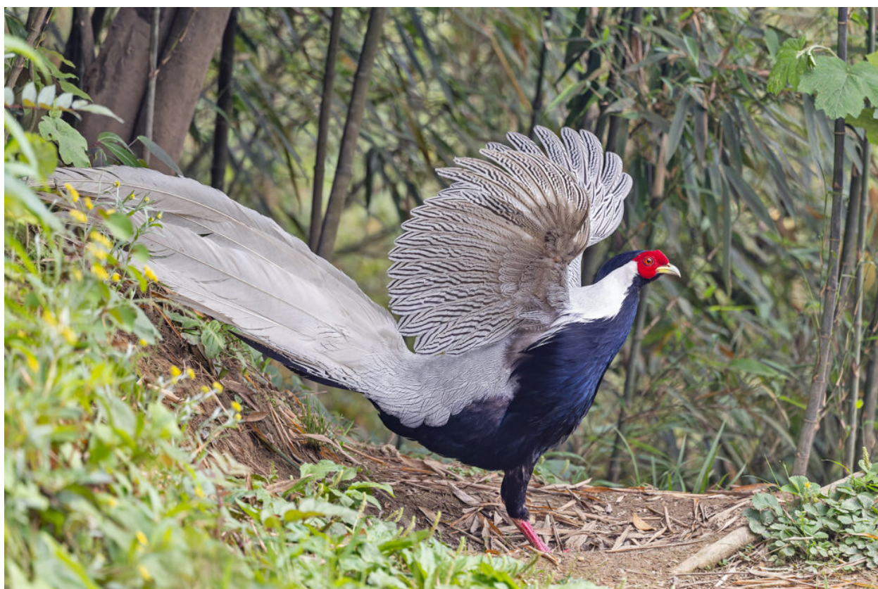
Silver Pheasant