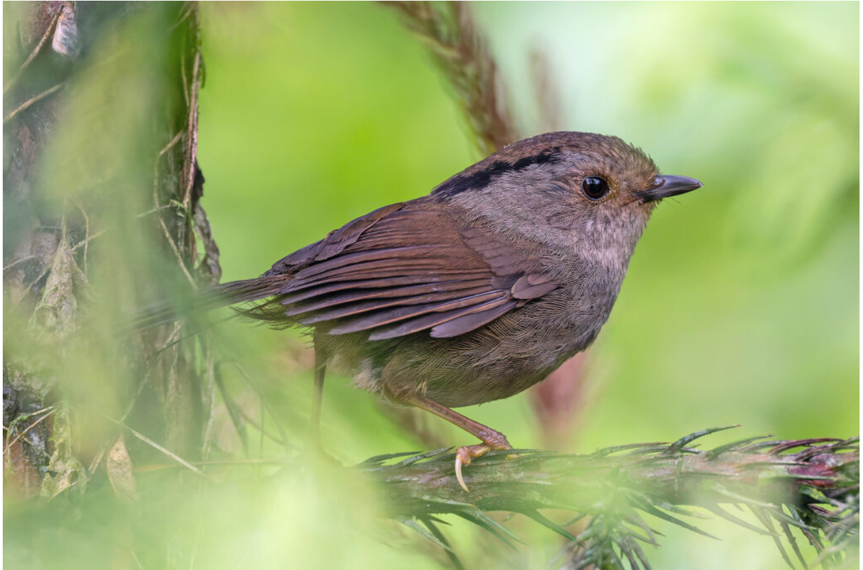
Dusky Fulvetta