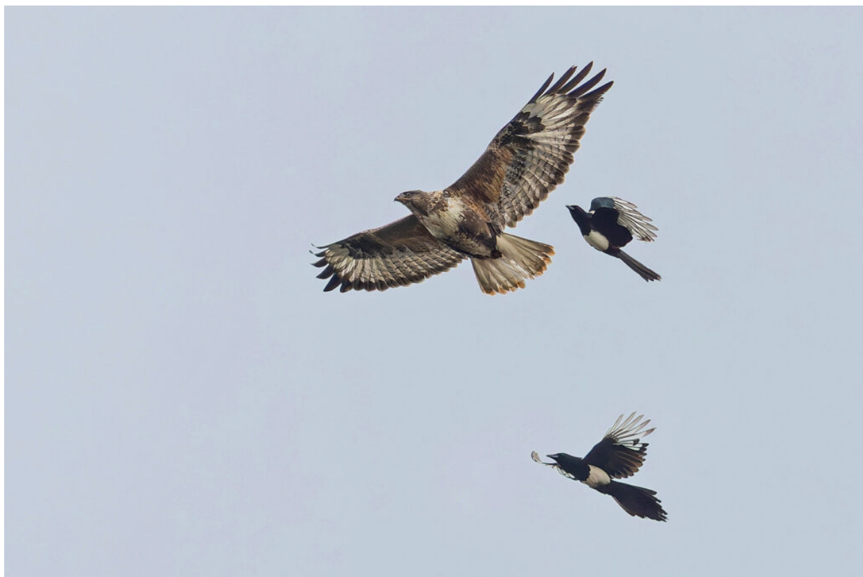
Upland Buzzard