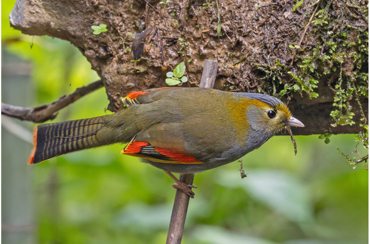
Emei Liocichla