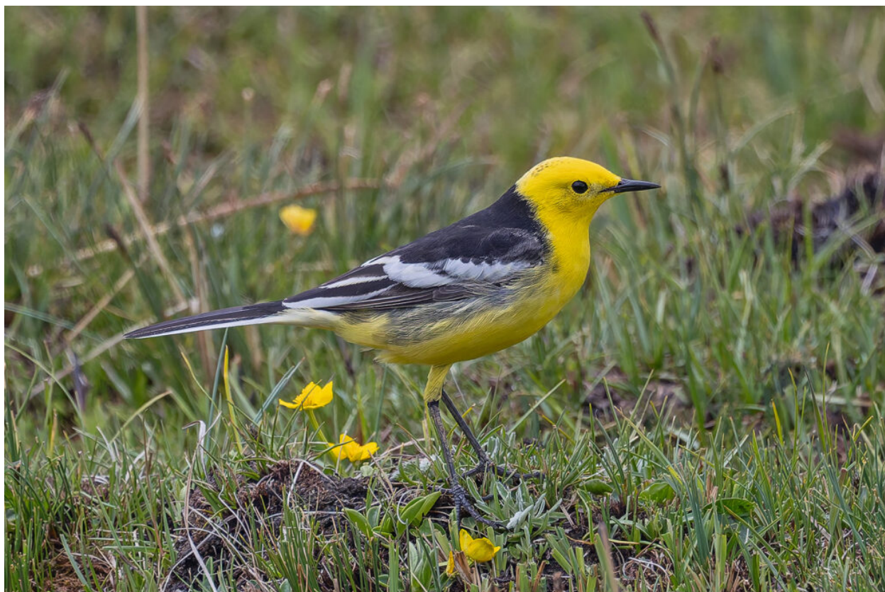
Citrine Wagtail