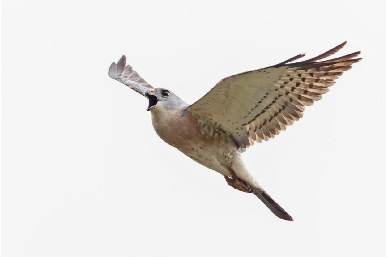
Chinese Sparrowhawk