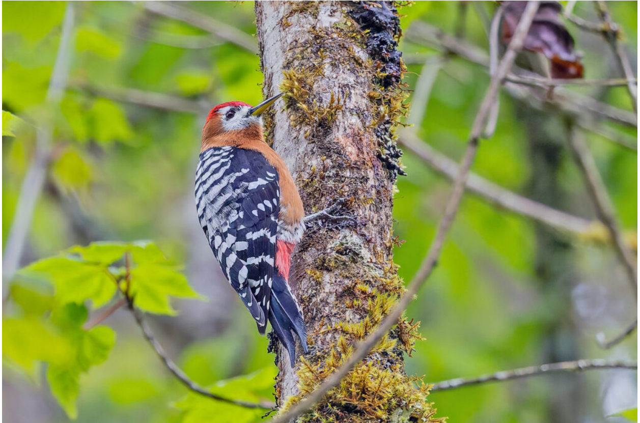
Rufous-bellied Woodpecker