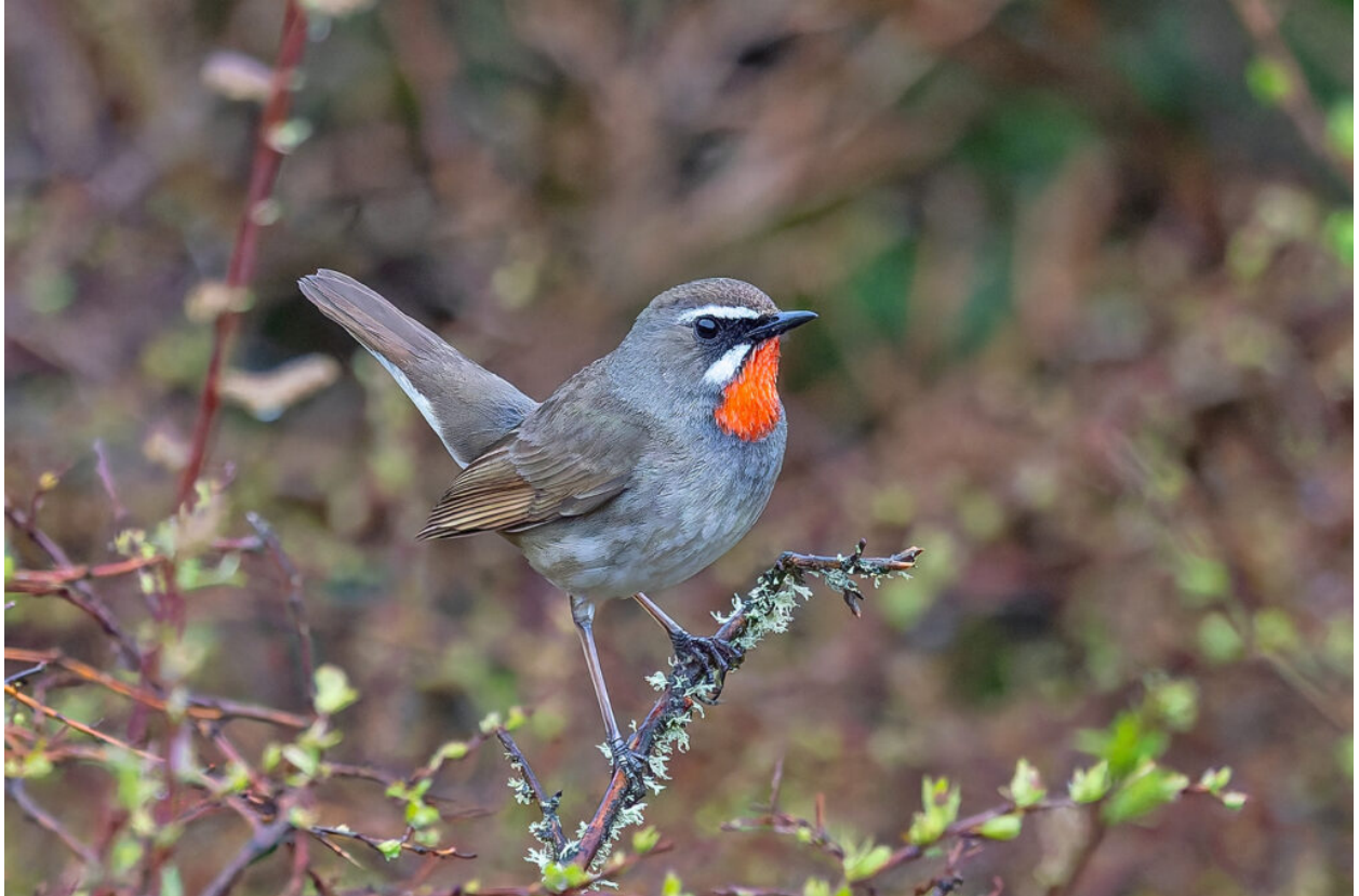
Siberian Rubythroat