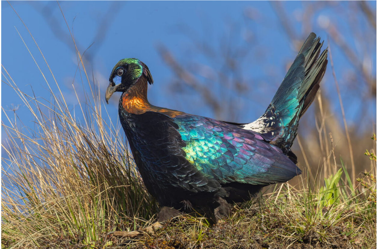
Chinese Monal