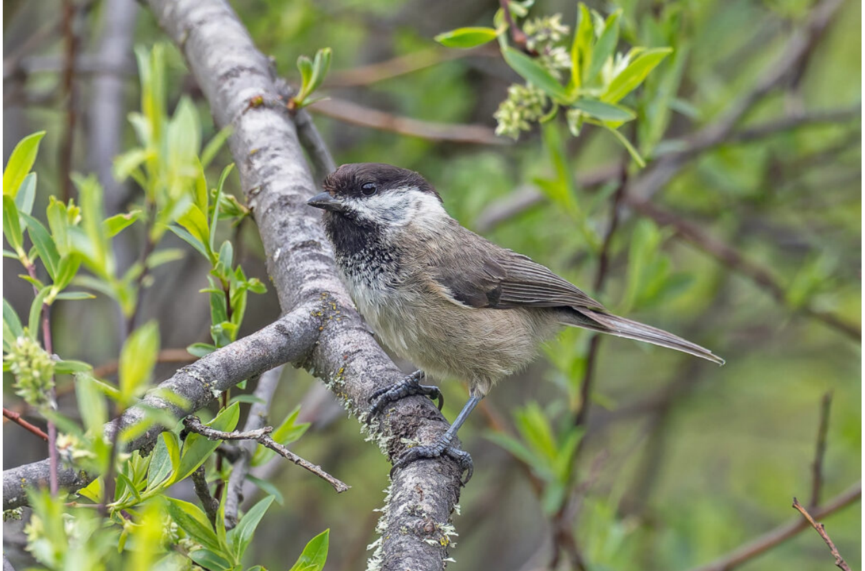
Sichuan Tit