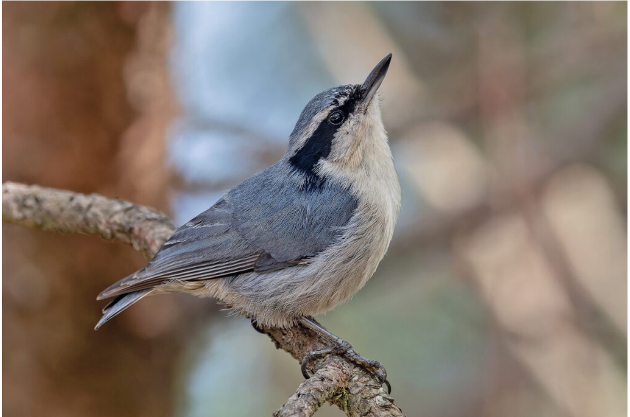
Yunnan Nuthatch