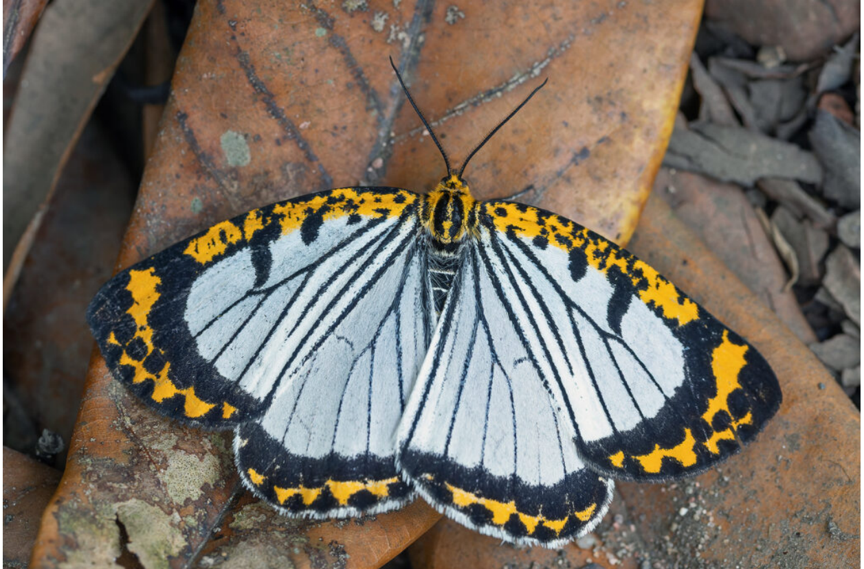
Parabraxas davidi