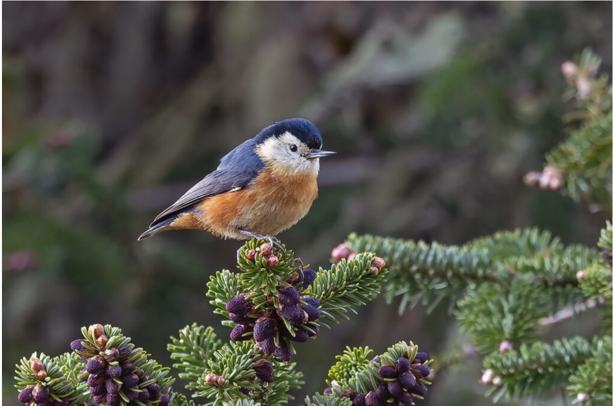
Przevalski's Nuthatch