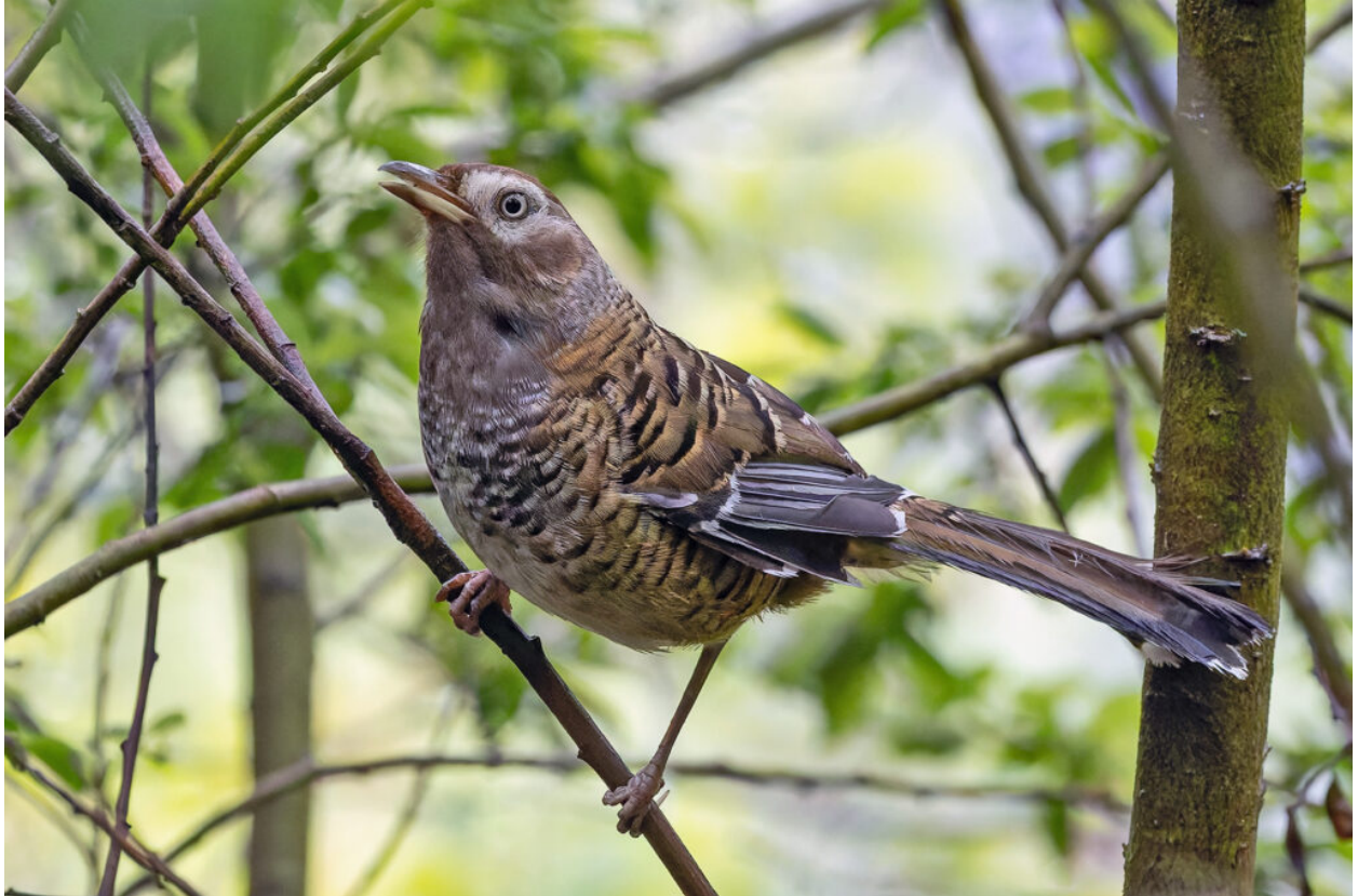
Barred Laughingthrush