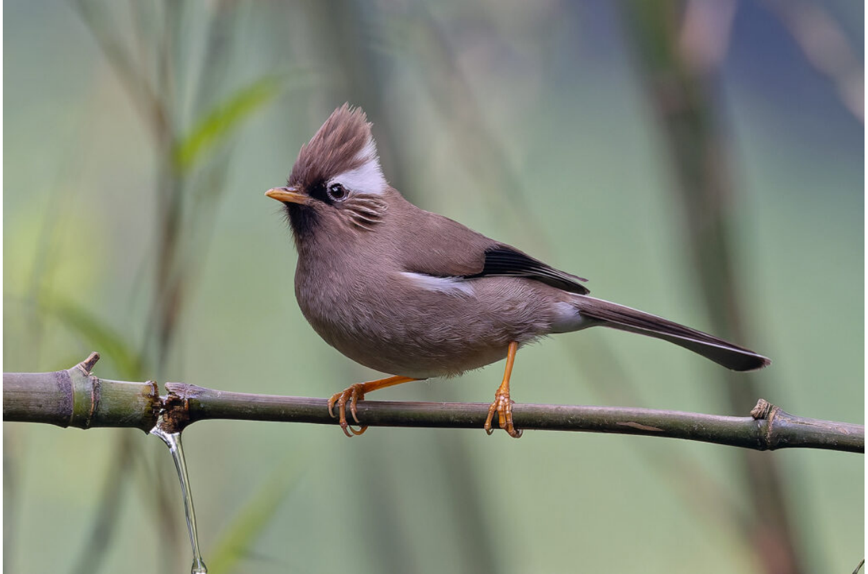
White-collared Yuhina