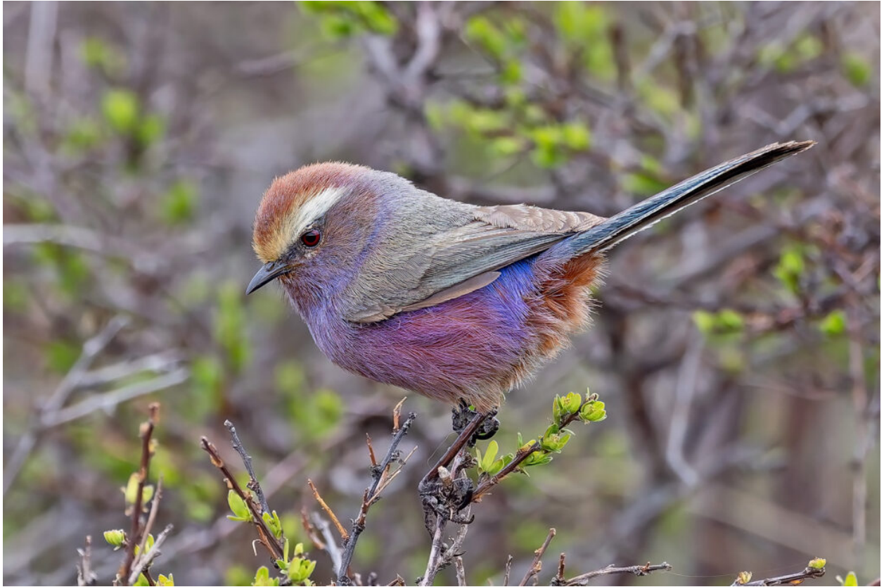
White-browed Tit Warbler