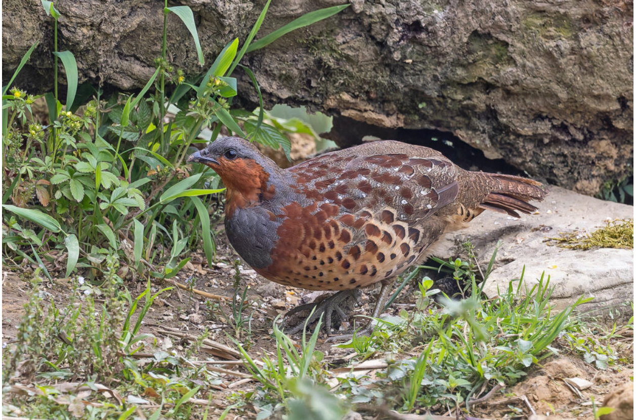
Chinese Bamboo Partridge