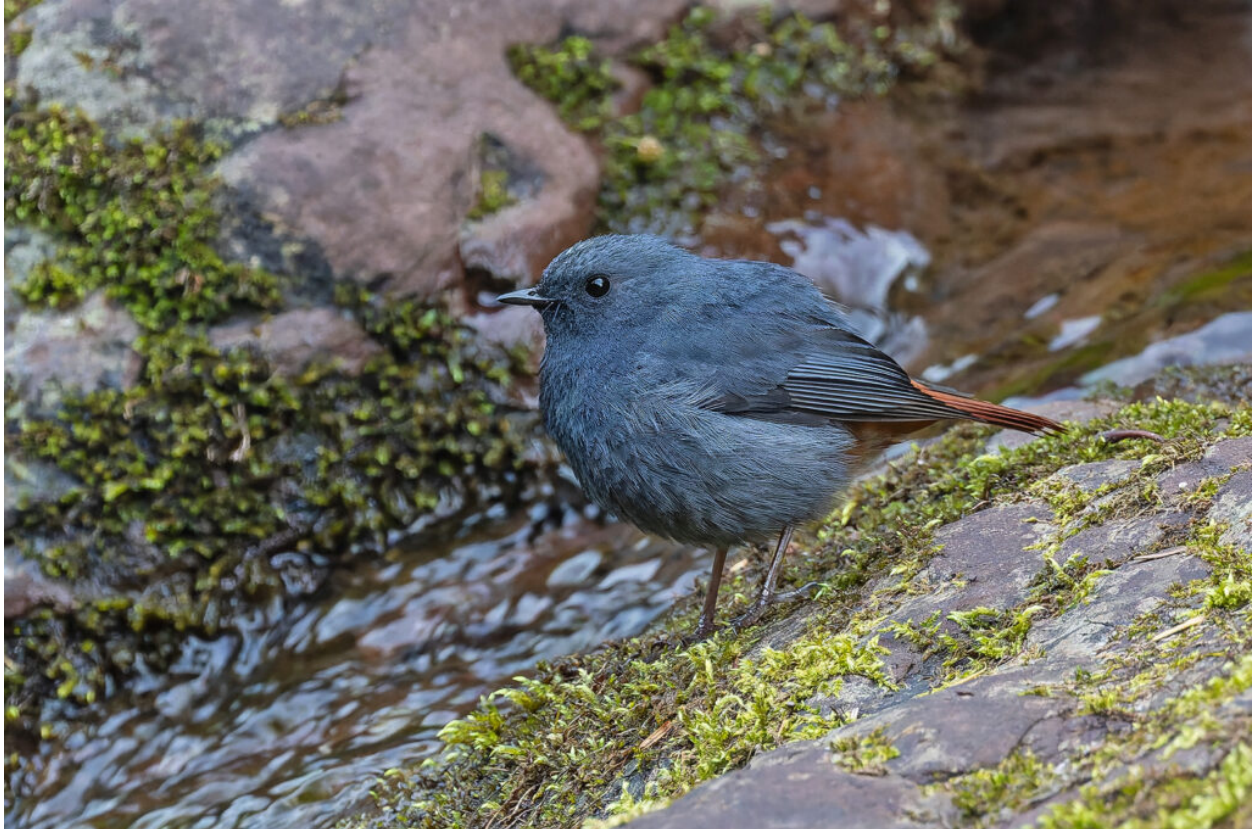
Plumbeous Redstart