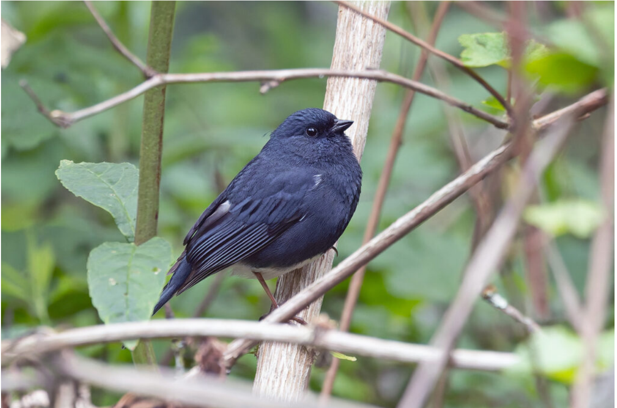
Slaty Bunting