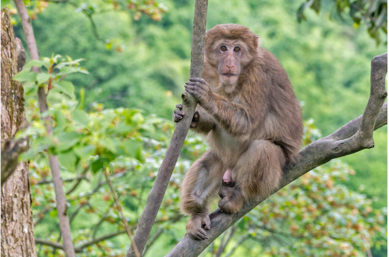
Tibetan Macaque