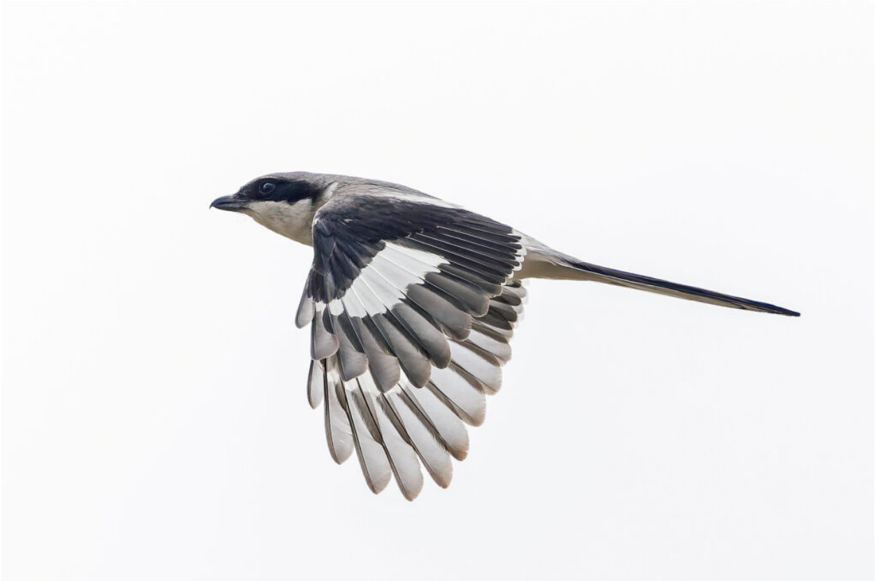
Giant Grey Shrike