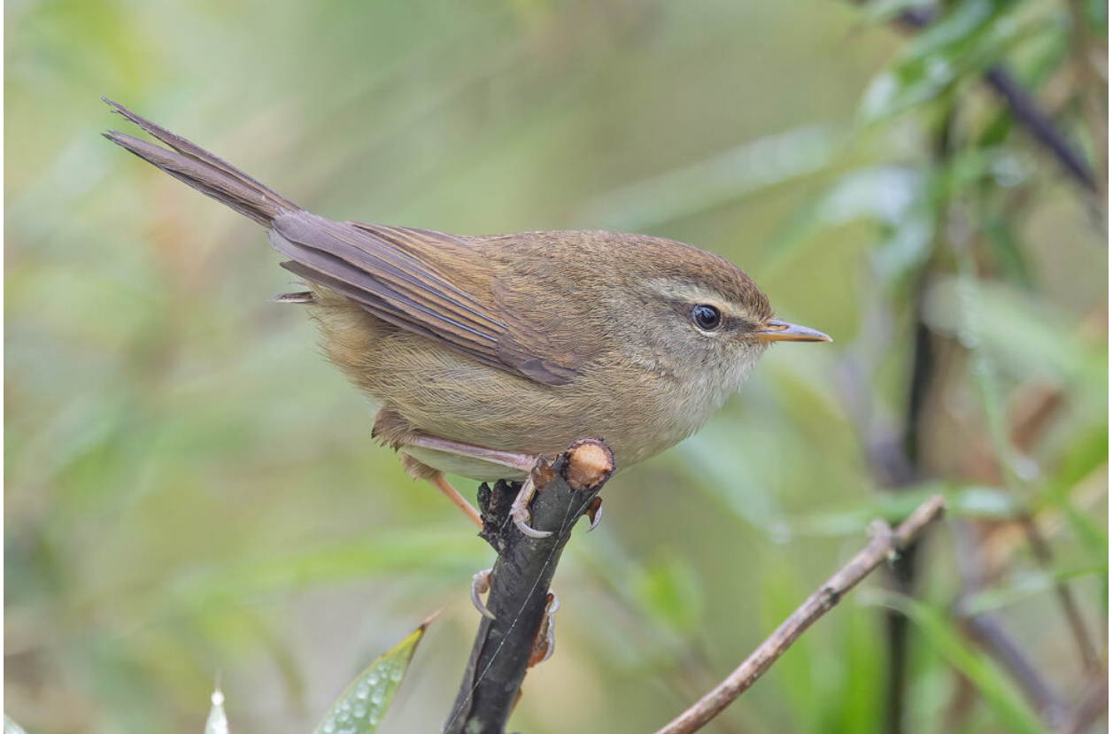
Yellow-bellied Bush Warbler