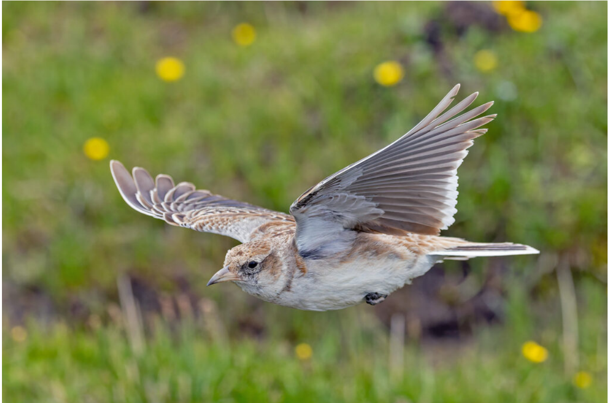
Tibetan Lark