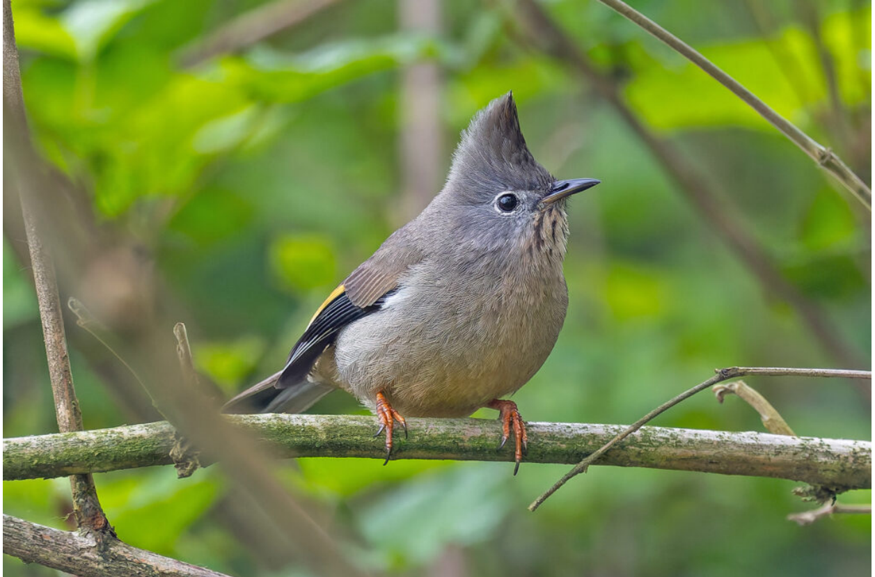
Stripe-throated Yuhina