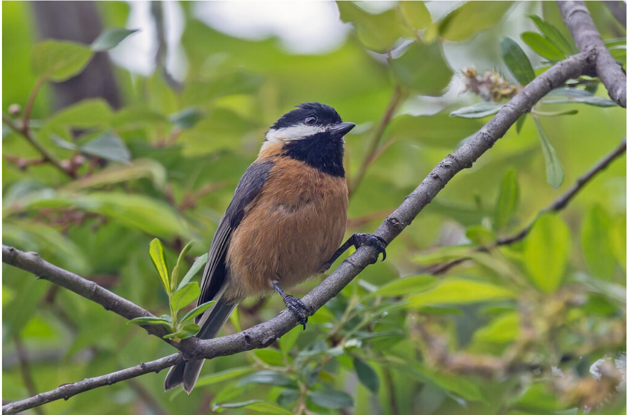
Pere David's Tit