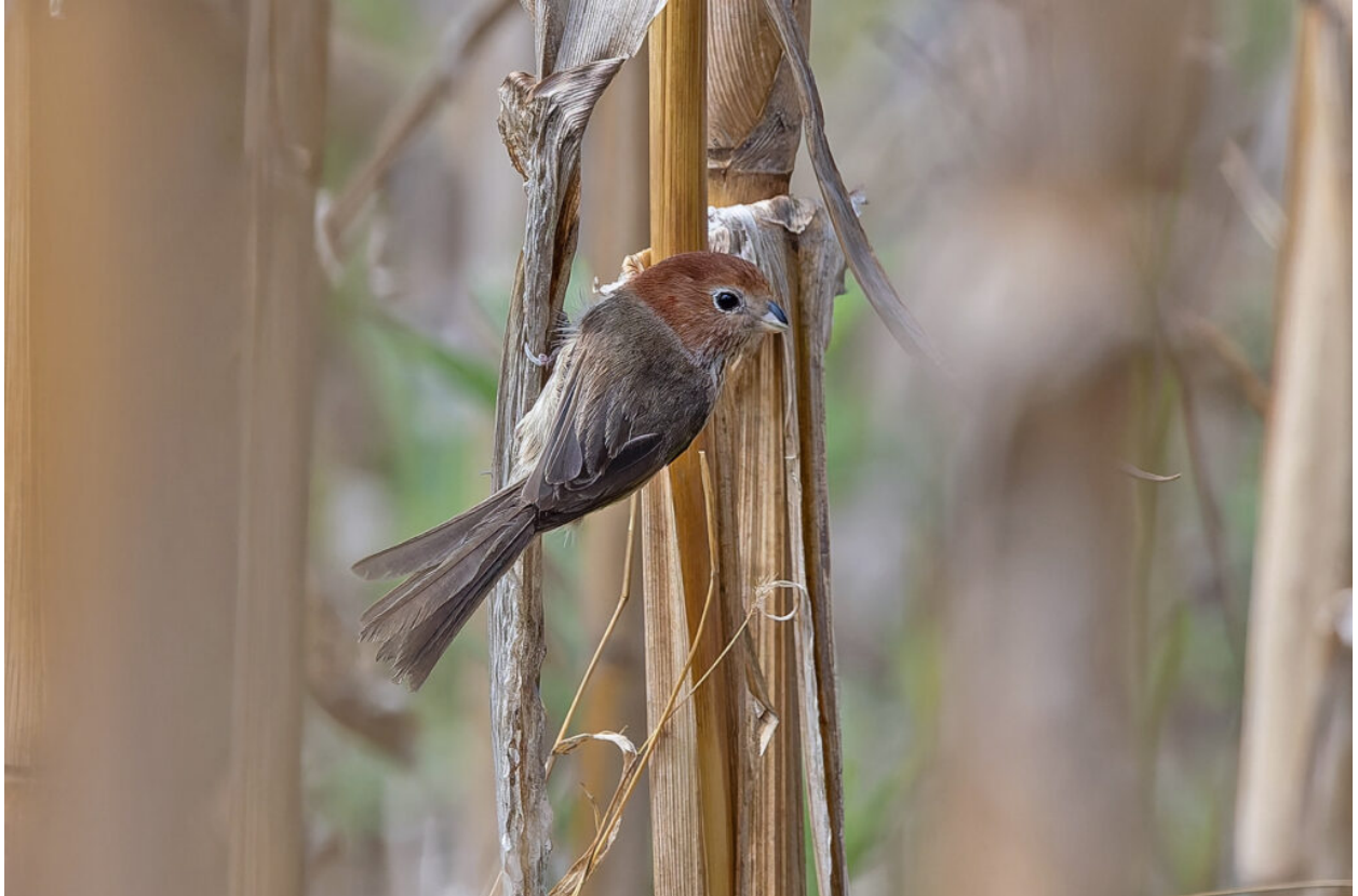
Eye-ringed Parrotbill