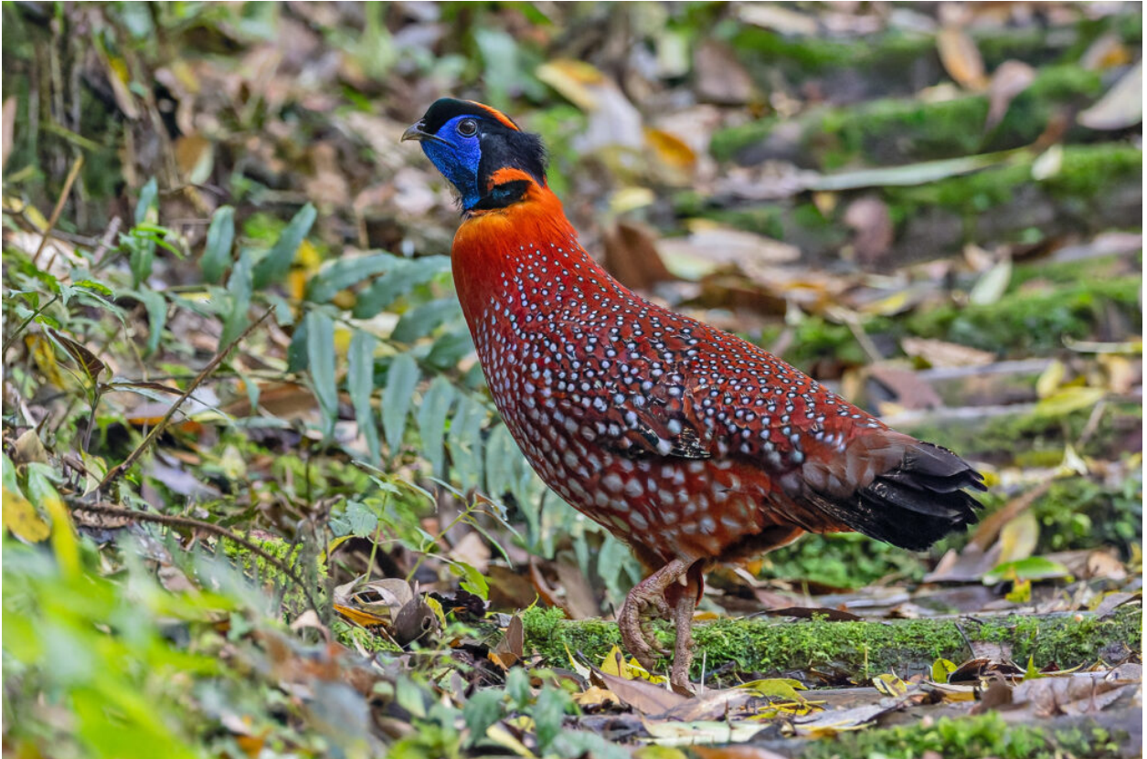
Temminck's Tragopan