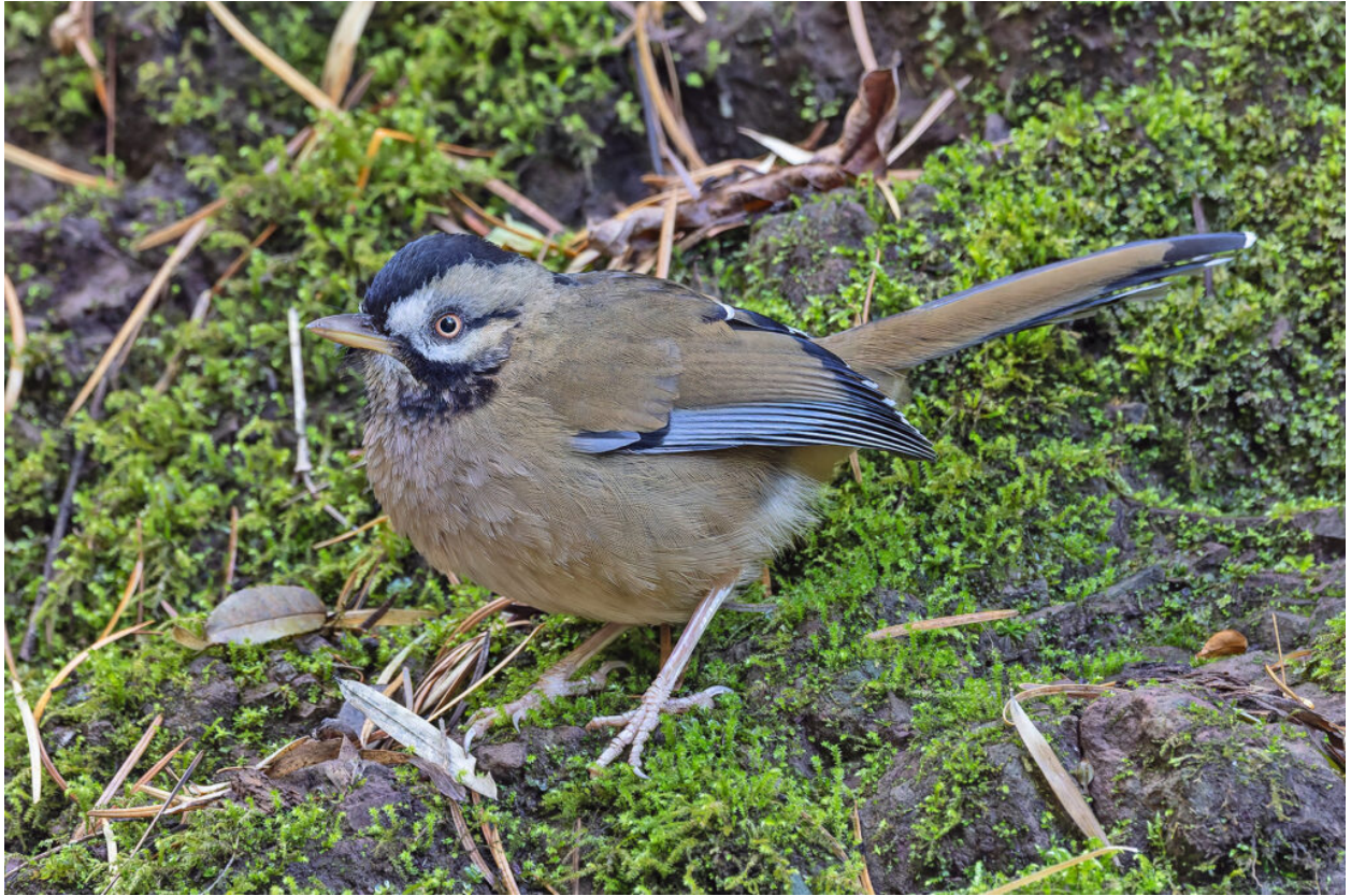
(Western) Moustached Laughingthrush