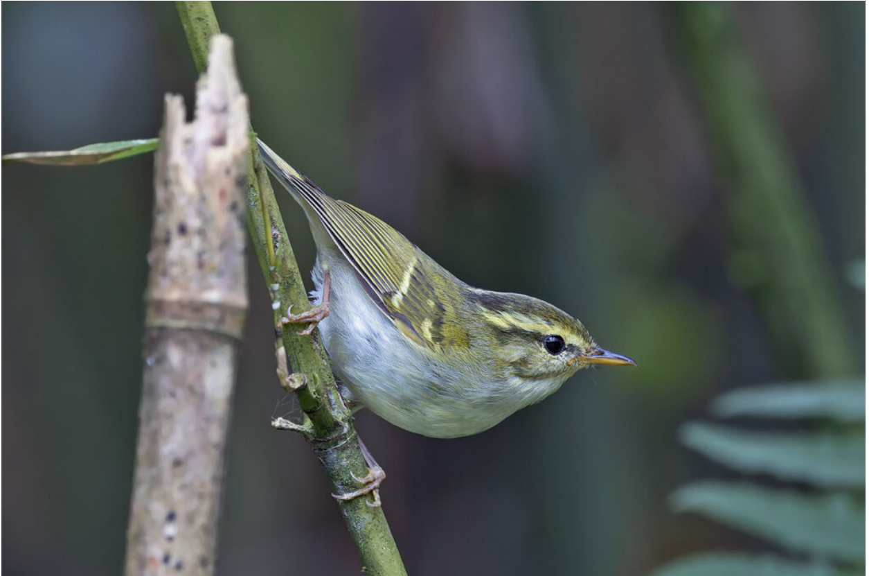
Kloss's Leaf Warbler