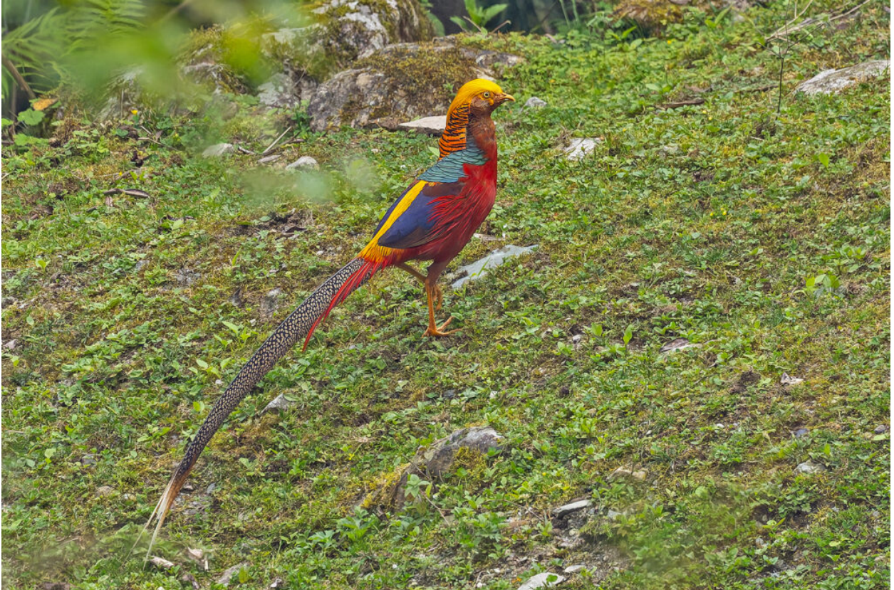
Golden Pheasant