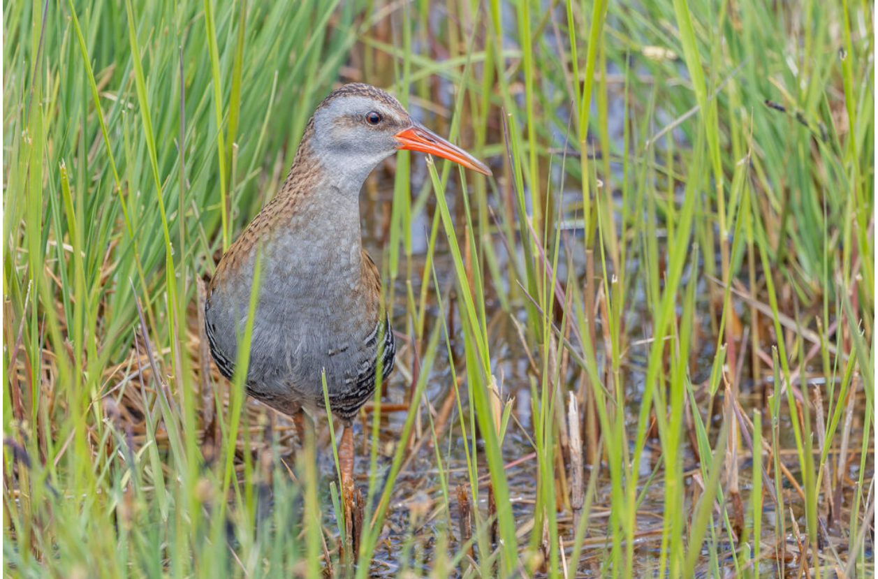
Brown-cheeked Rail