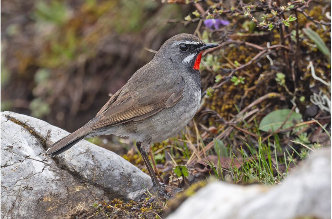
Chinese Rubythroat