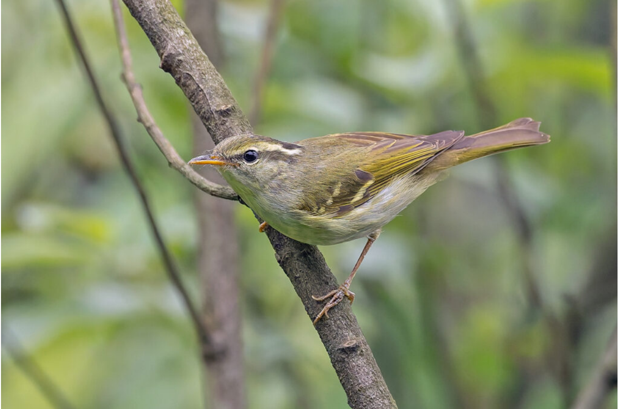
Claudia's Leaf Warbler