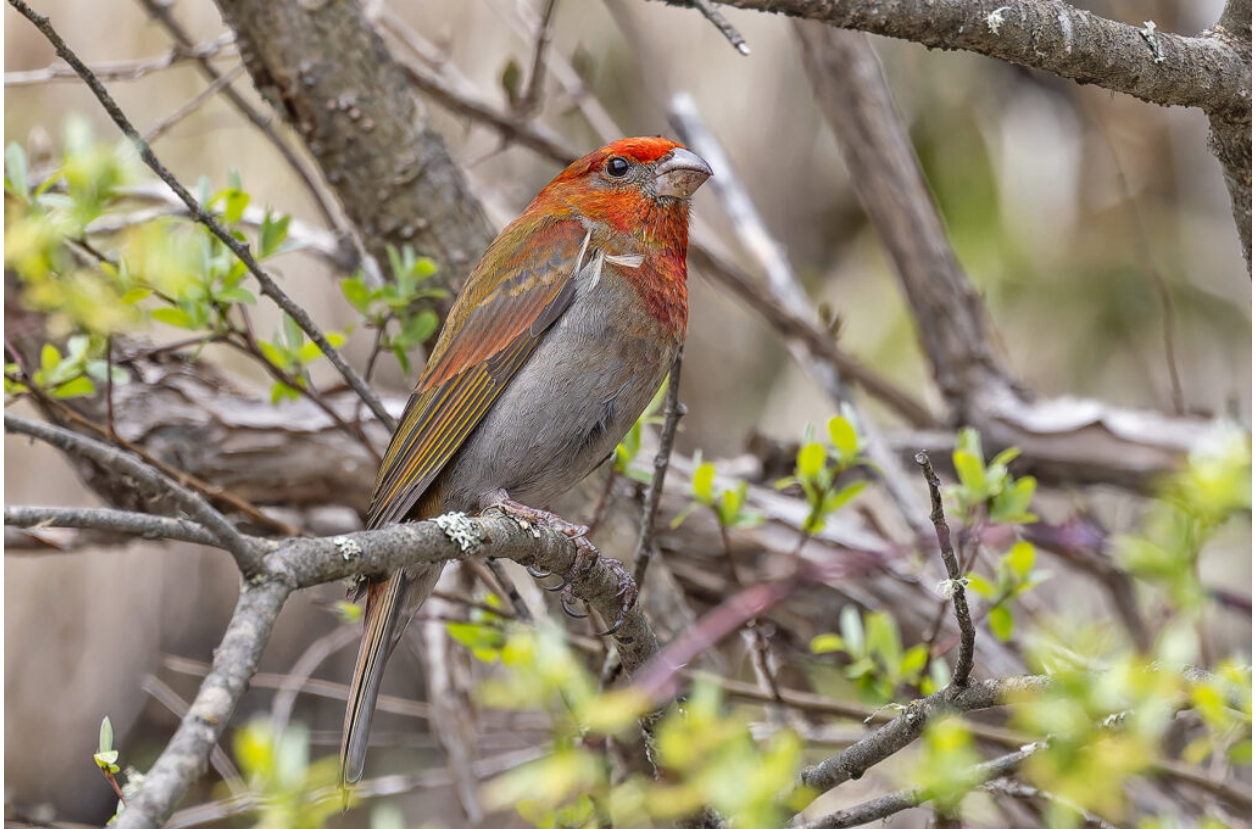
Crimson-browed Finch