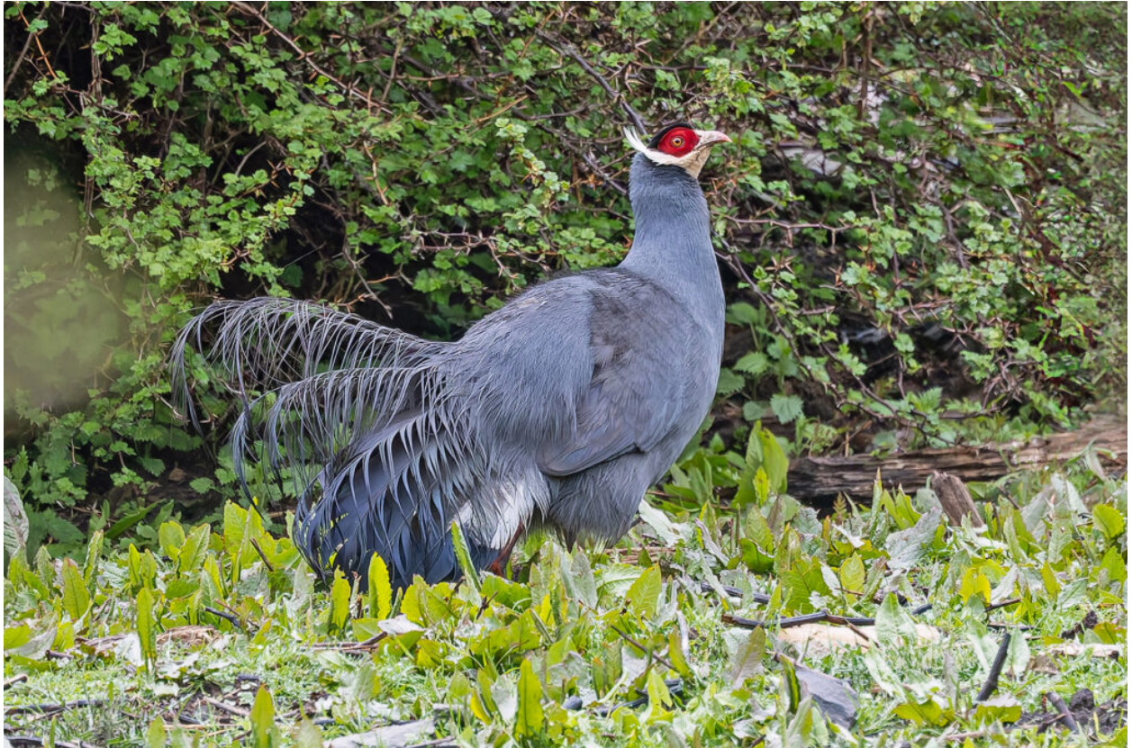
Blue Eared Pheasant