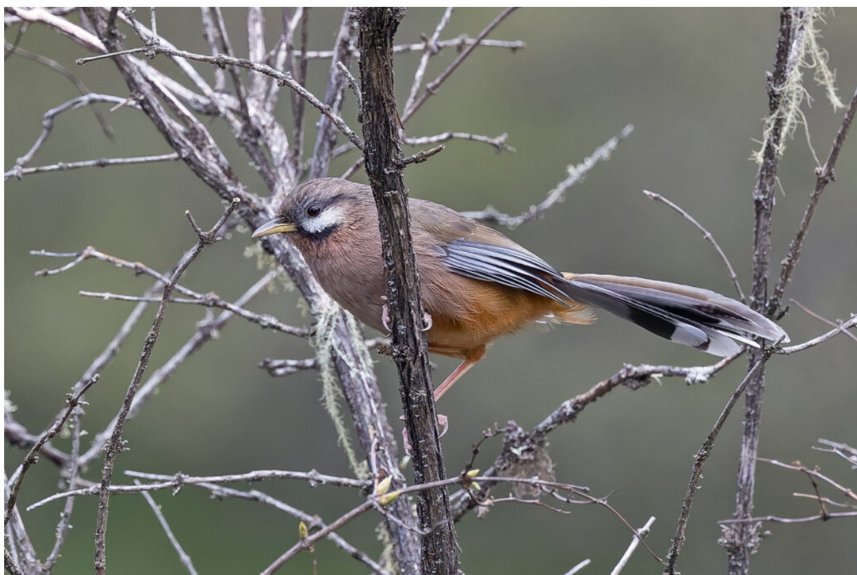
Snowy-cheeked Laughingthrush