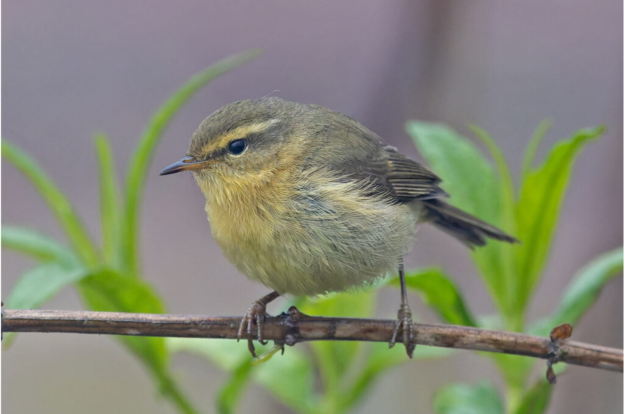
Buff-throated Warbler