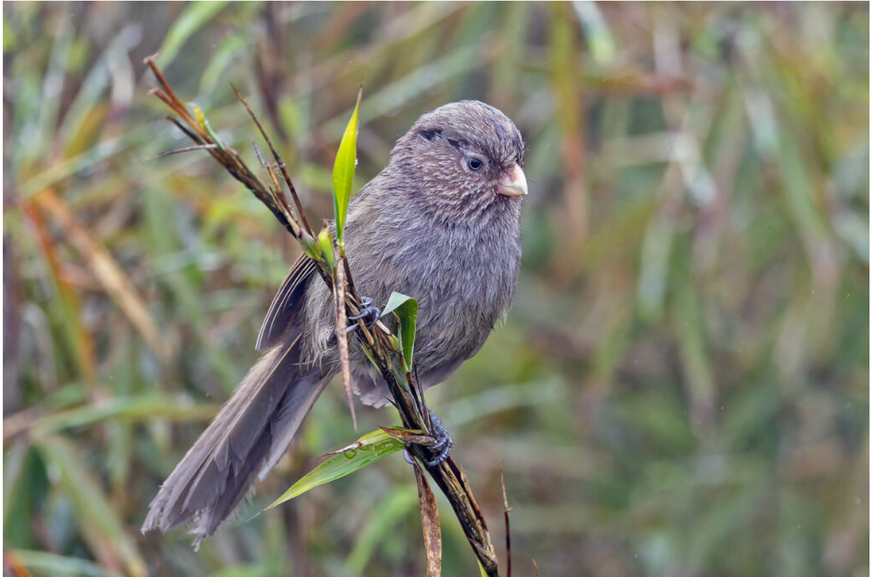
Brown Parrotbill