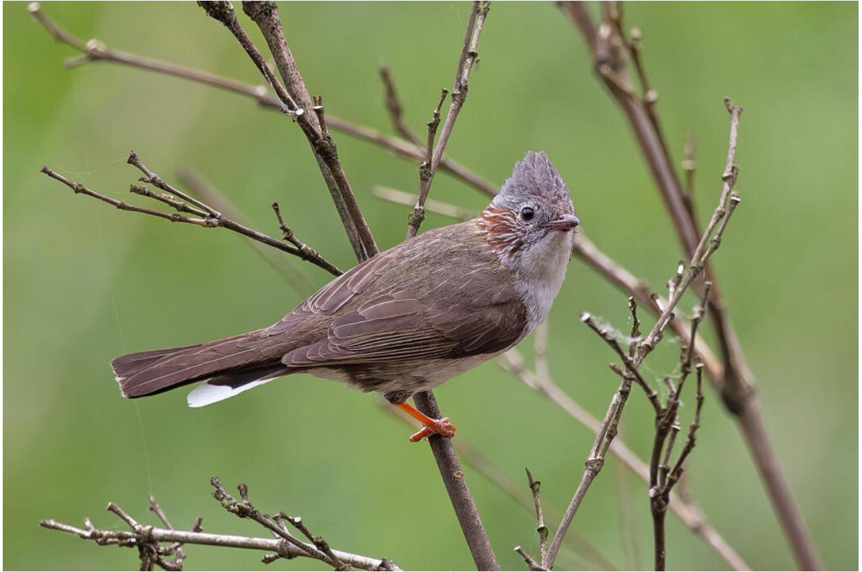
Indochinese Yuhina