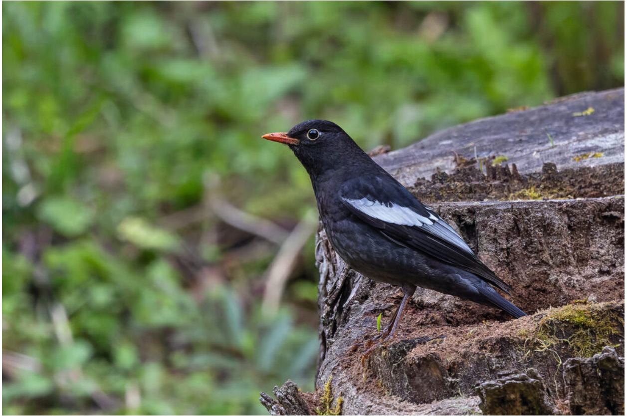
Grey-winged Blackbird