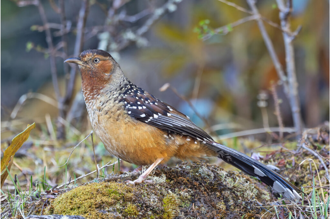
Giant Laughingthrush