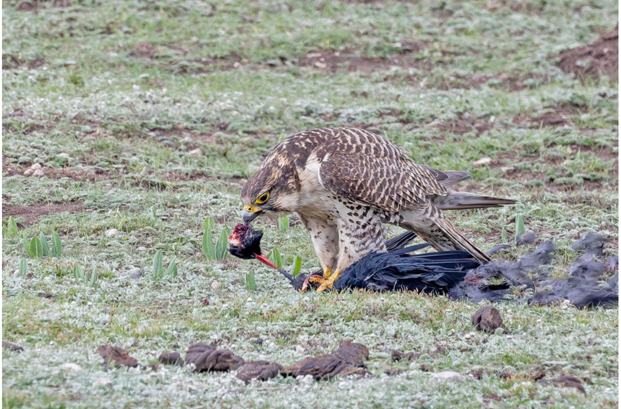
Saker Falcon