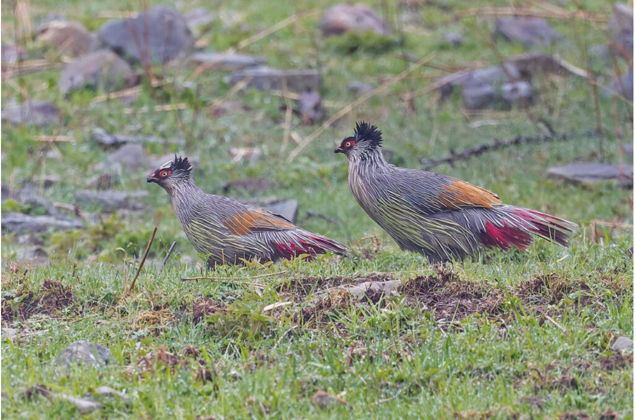
Blood Pheasants