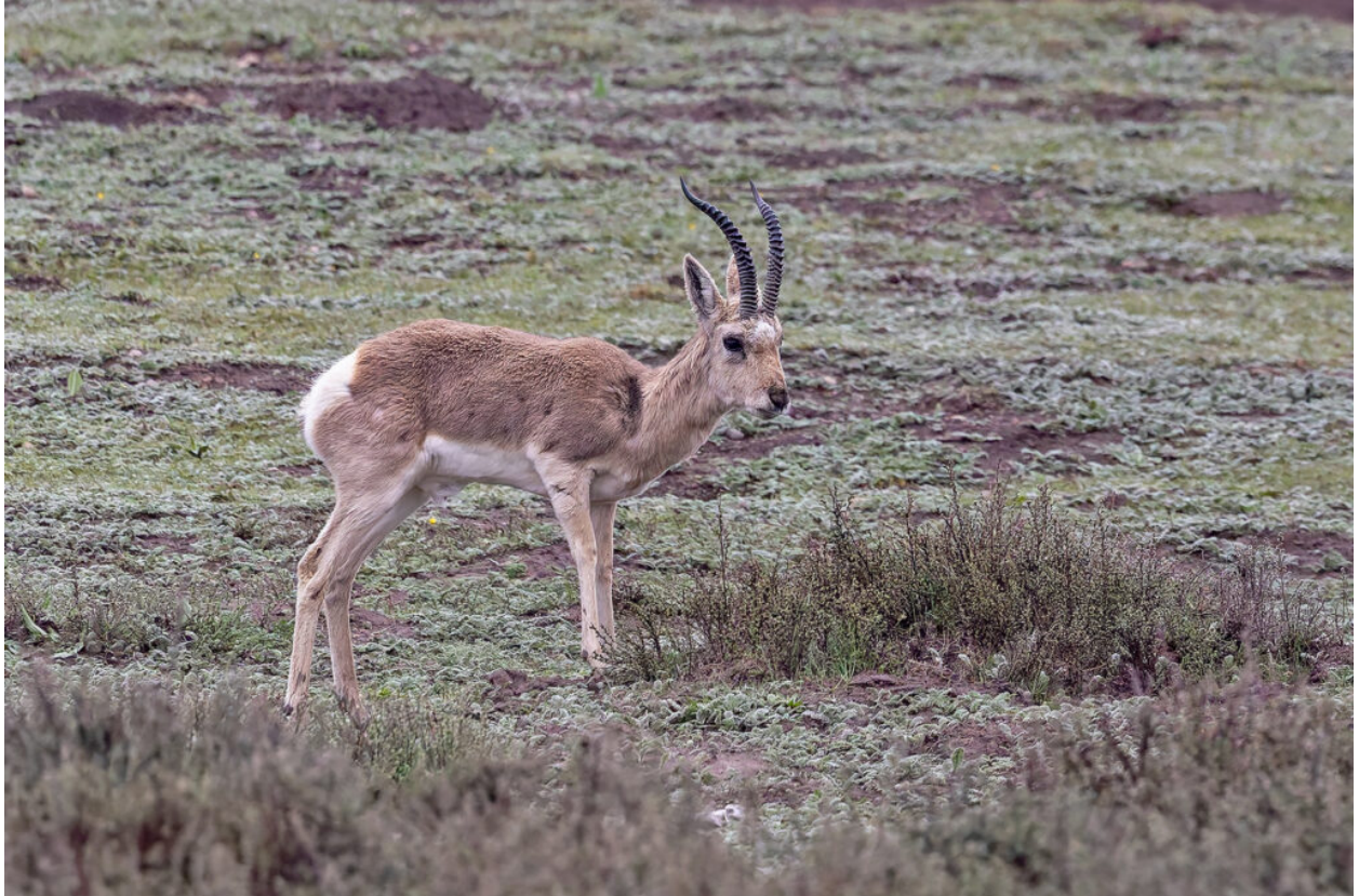
Tibetan Gazelle