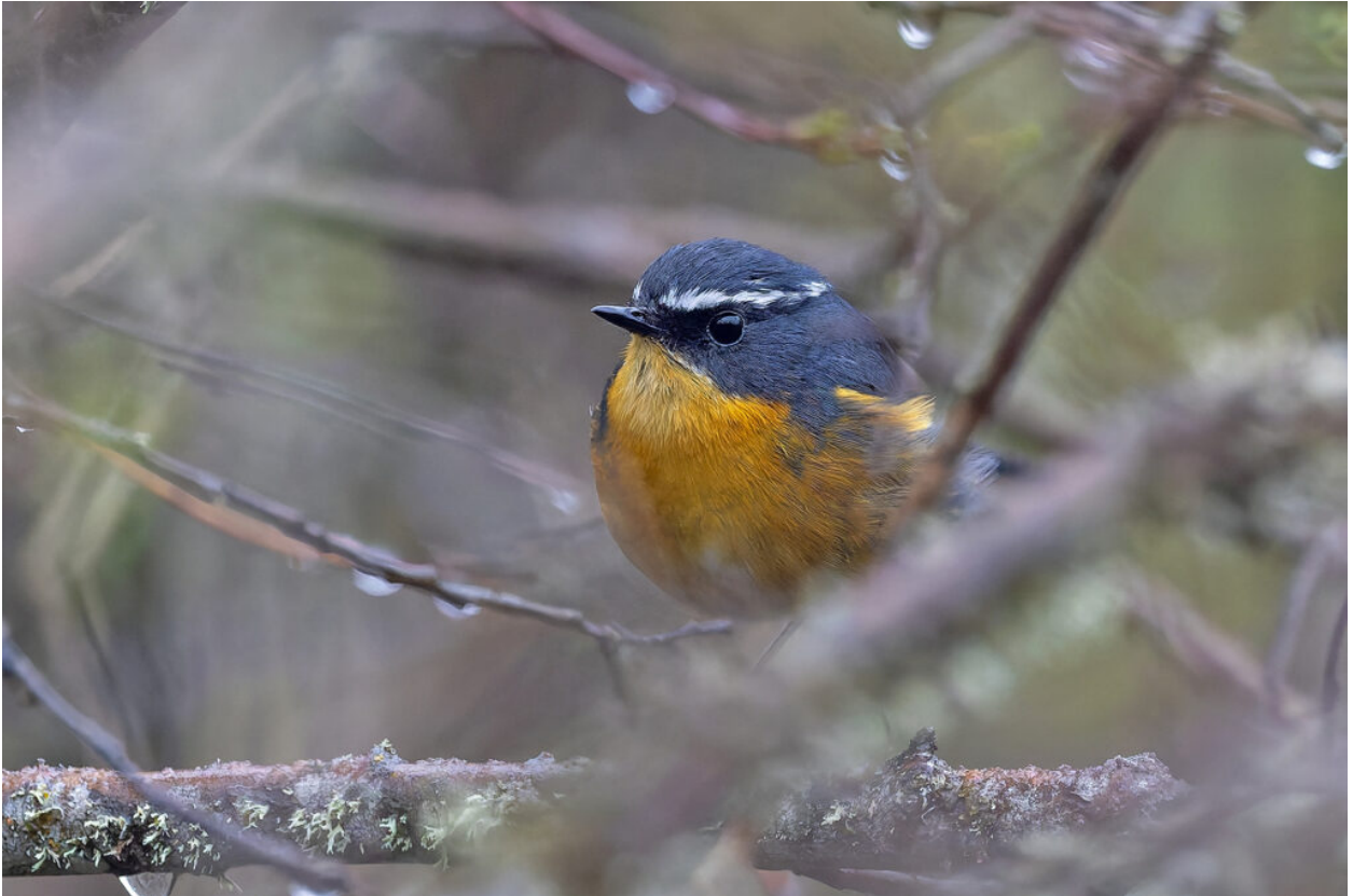
White-browed Bush Robin