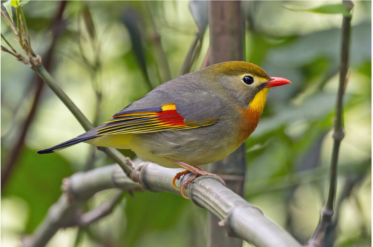
Red-billed Leiothrix