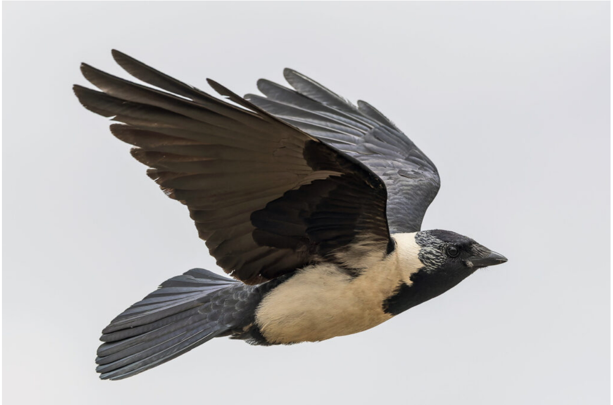
Daurian Jackdaw