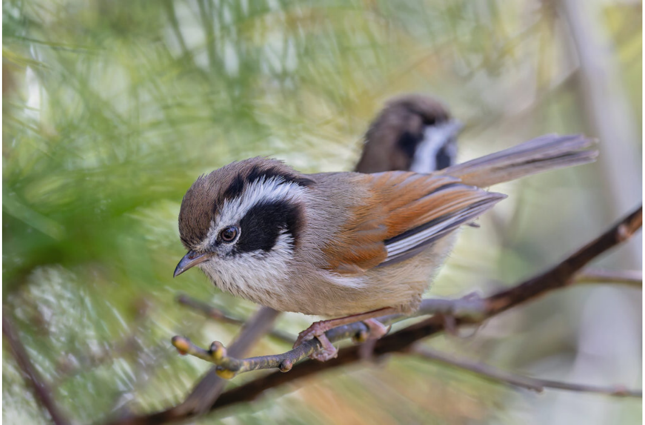
White-browed Fulvetta