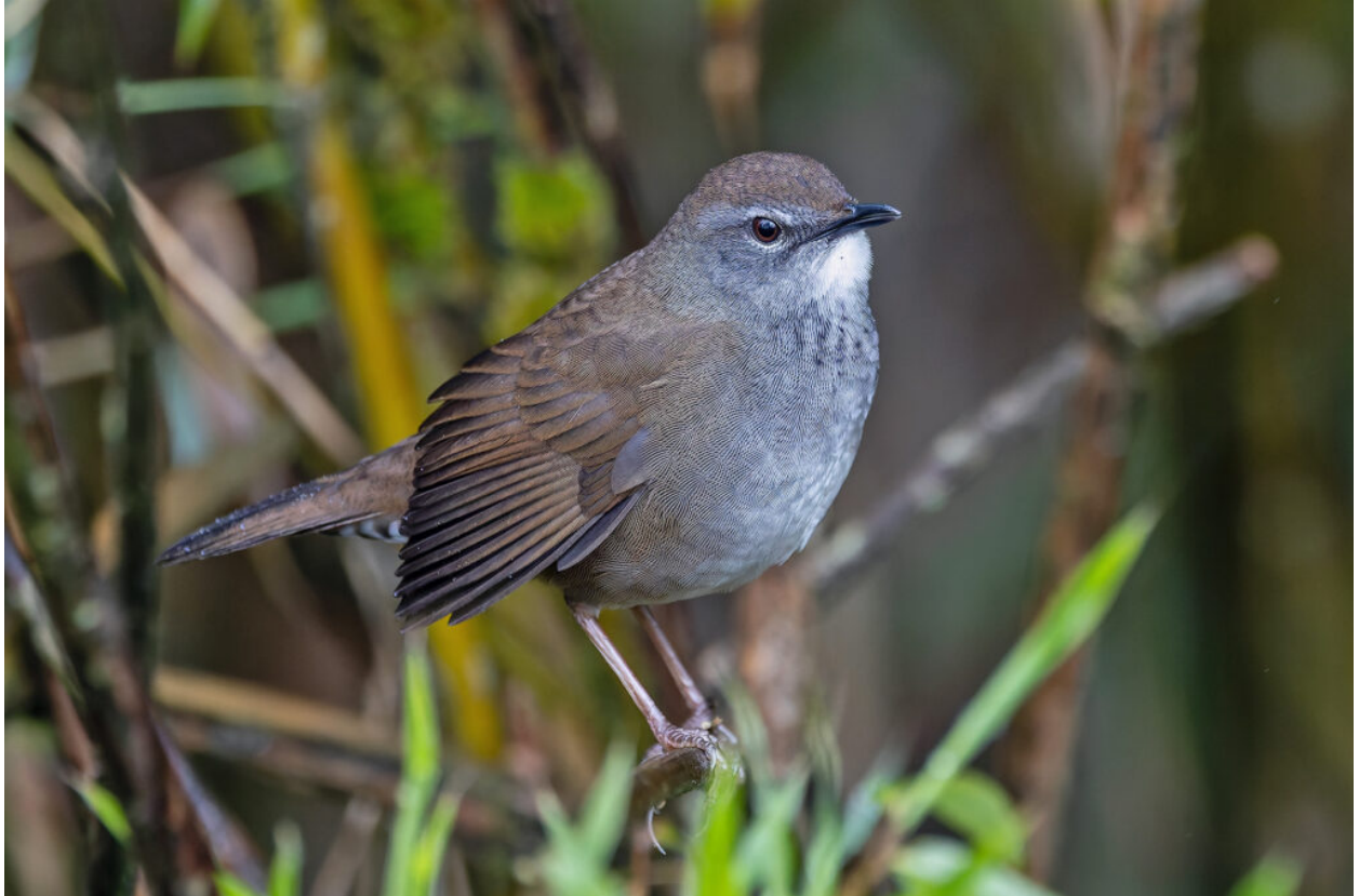
Spotted Bush Warbler