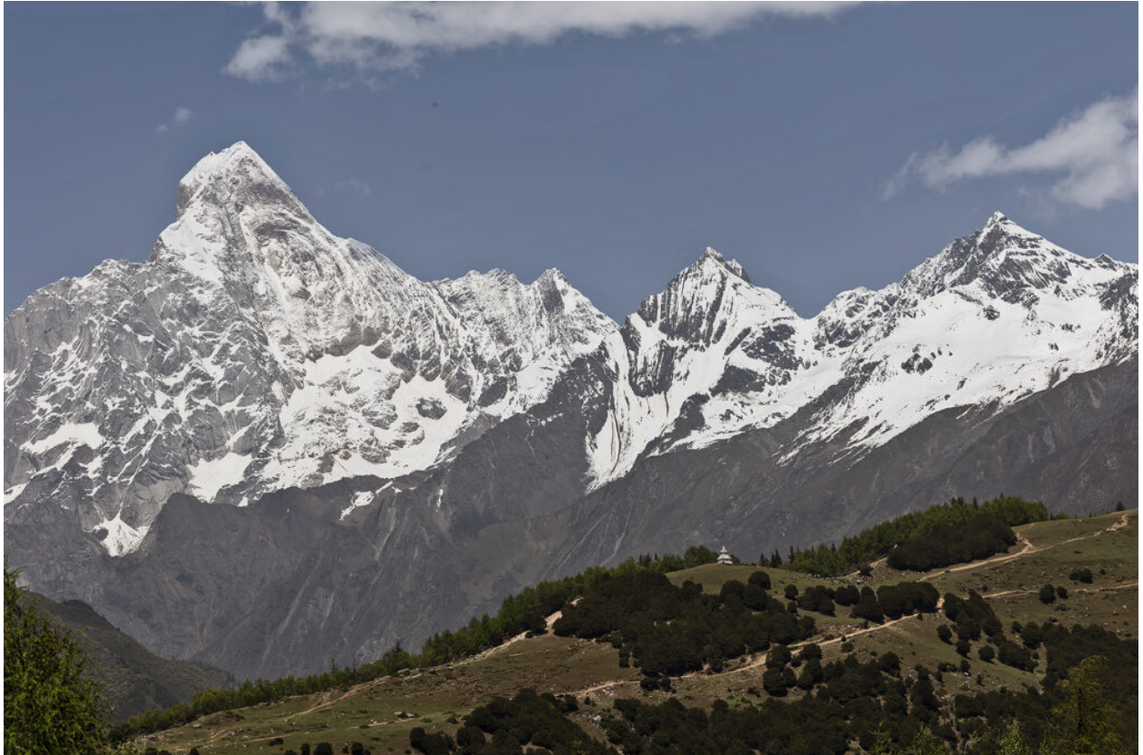
Balang Shan