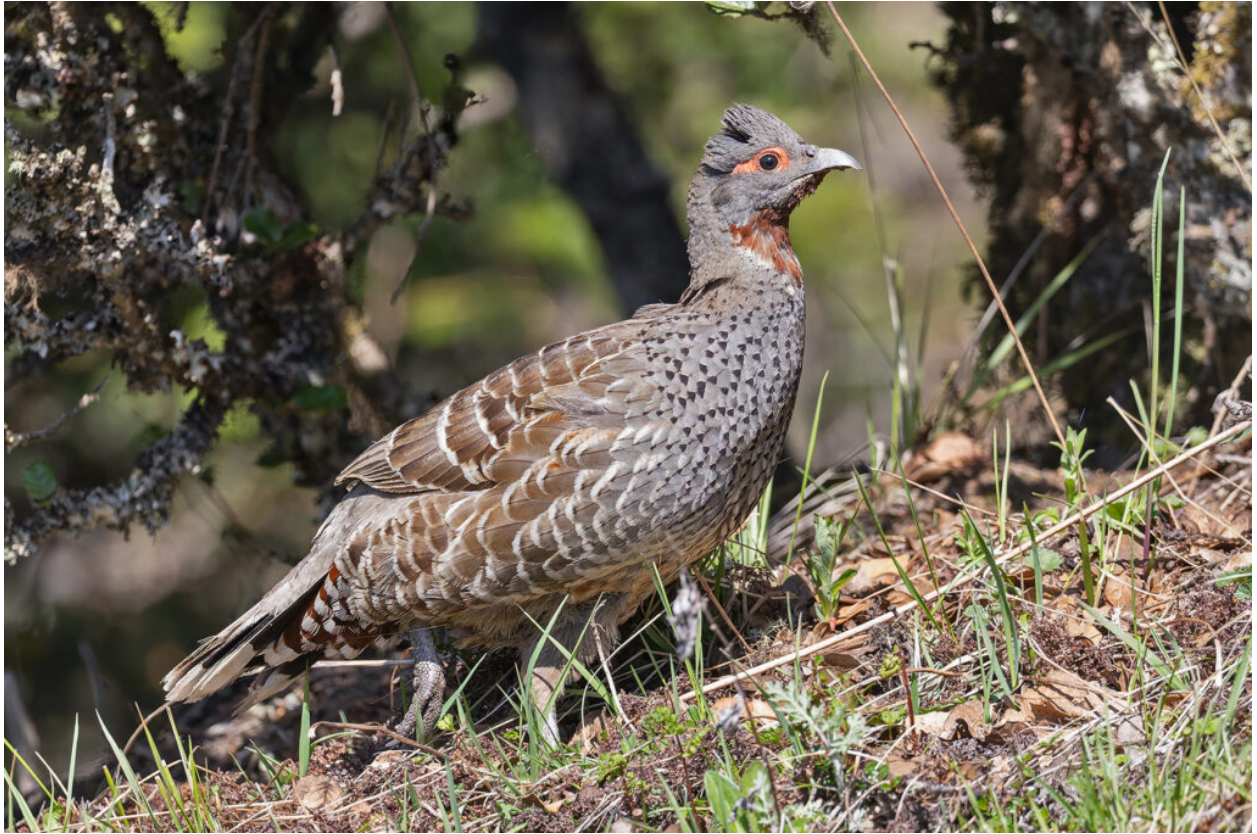
Chestnut-throated Monal Partridge