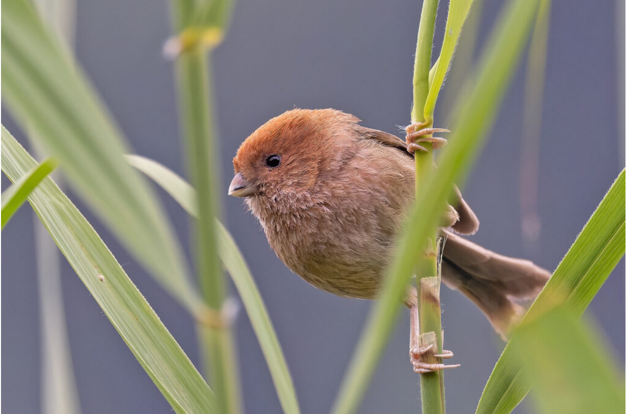
Vinous-throated Parrotbill