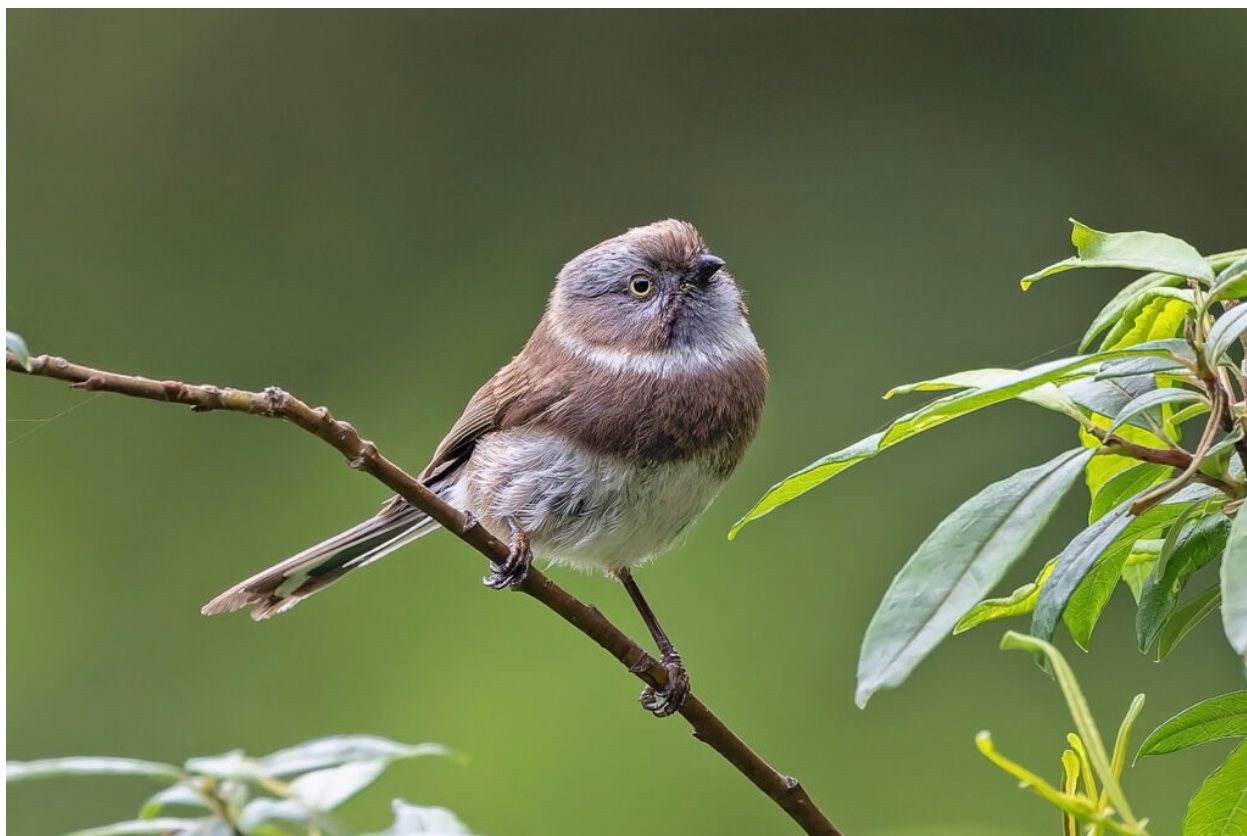
Sooty Bush-tit