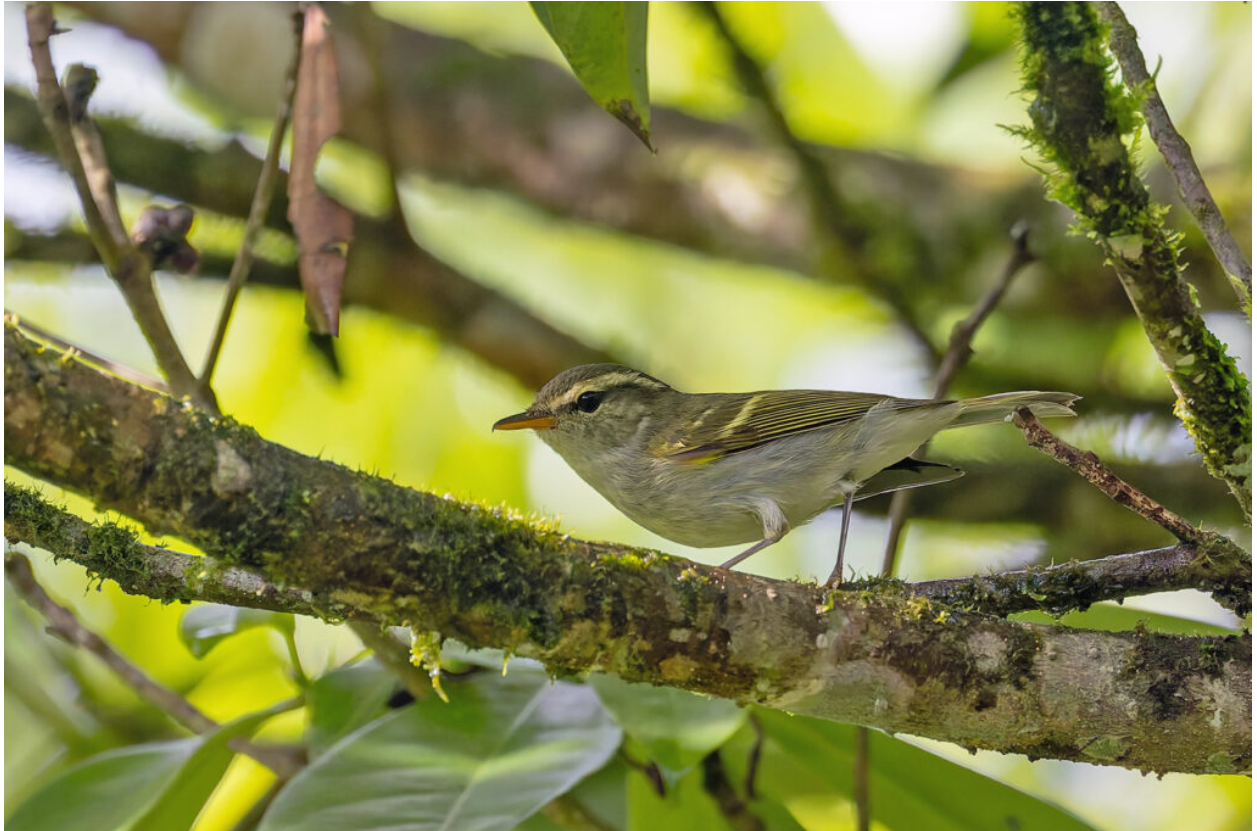
Emei Leaf Warbler