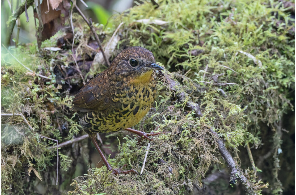
(Chinese) Scaly-breasted Cupwing