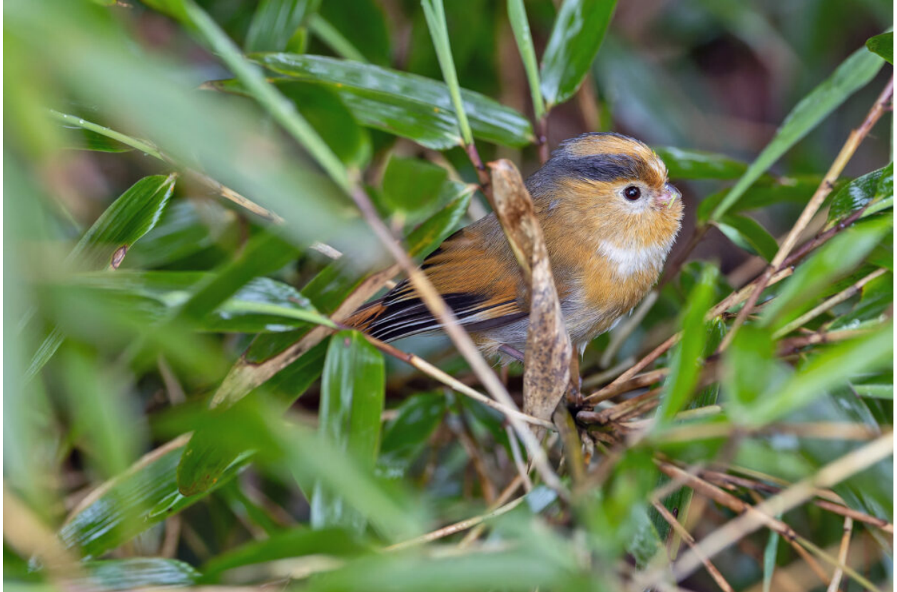
Fulvous Parrotbill