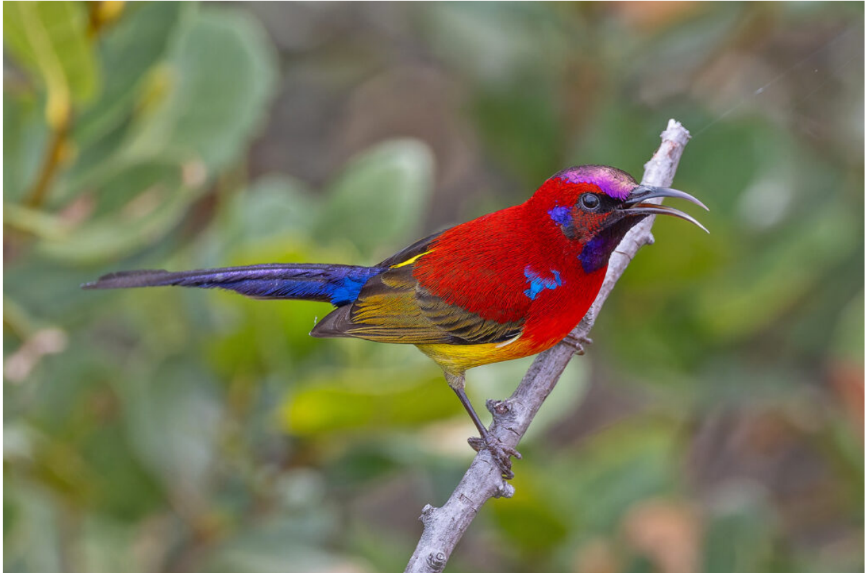
Mrs Gould's Sunbird