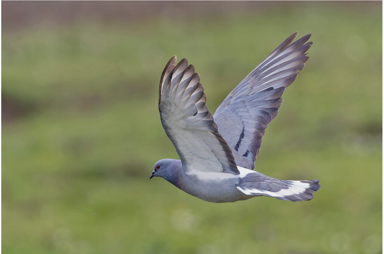
Hill Pigeon