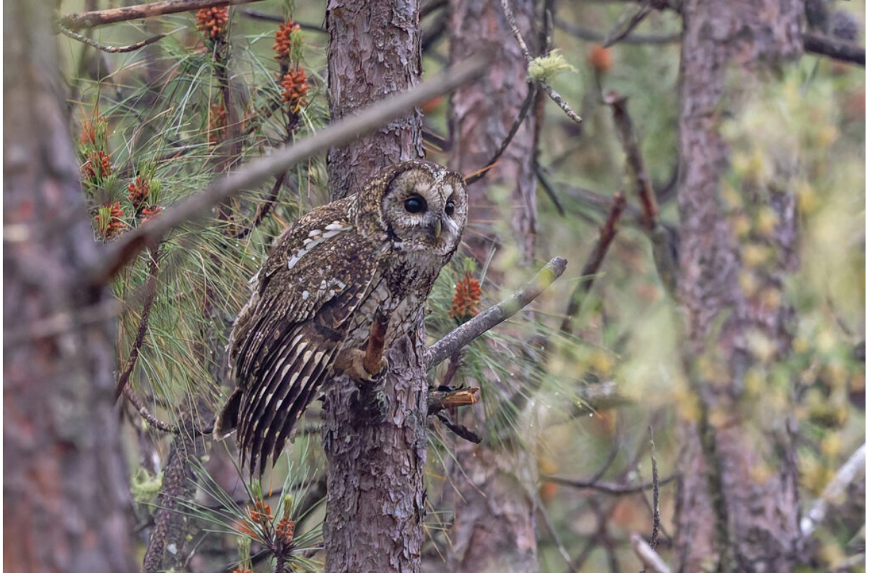
Himalayan Owl