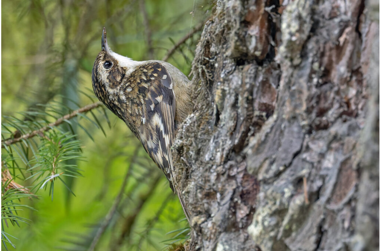
Sichuan Treecreeper