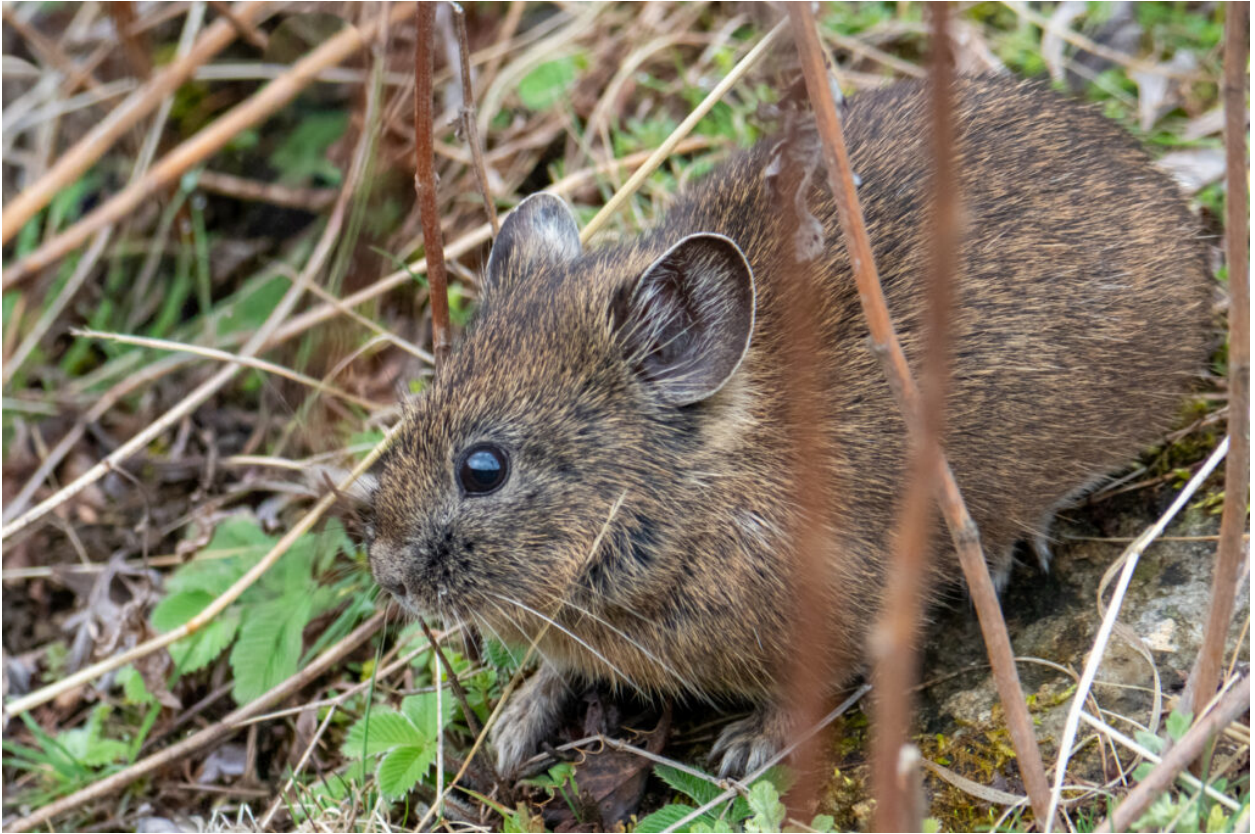
Moupin Pika