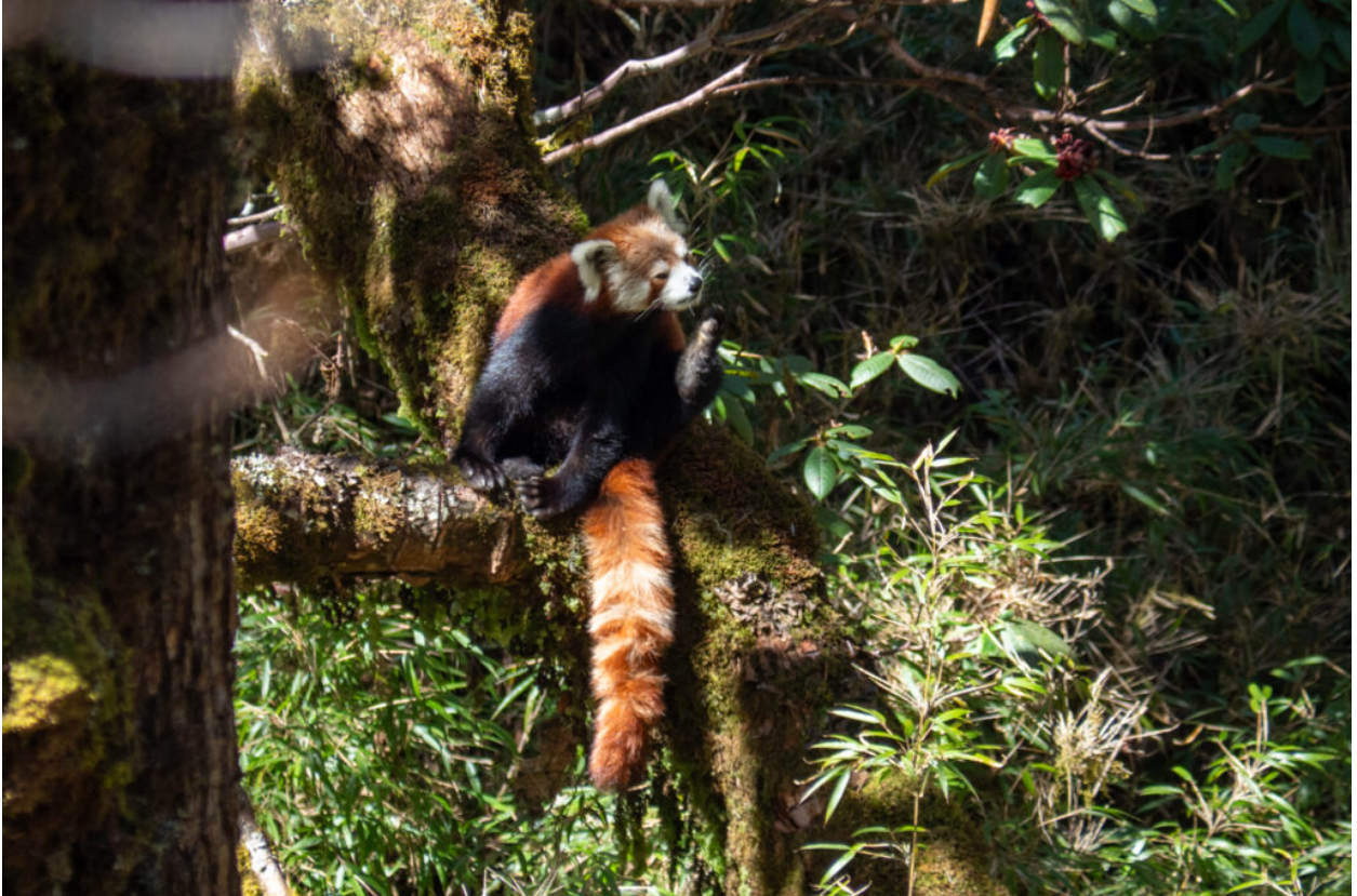
Red Panda