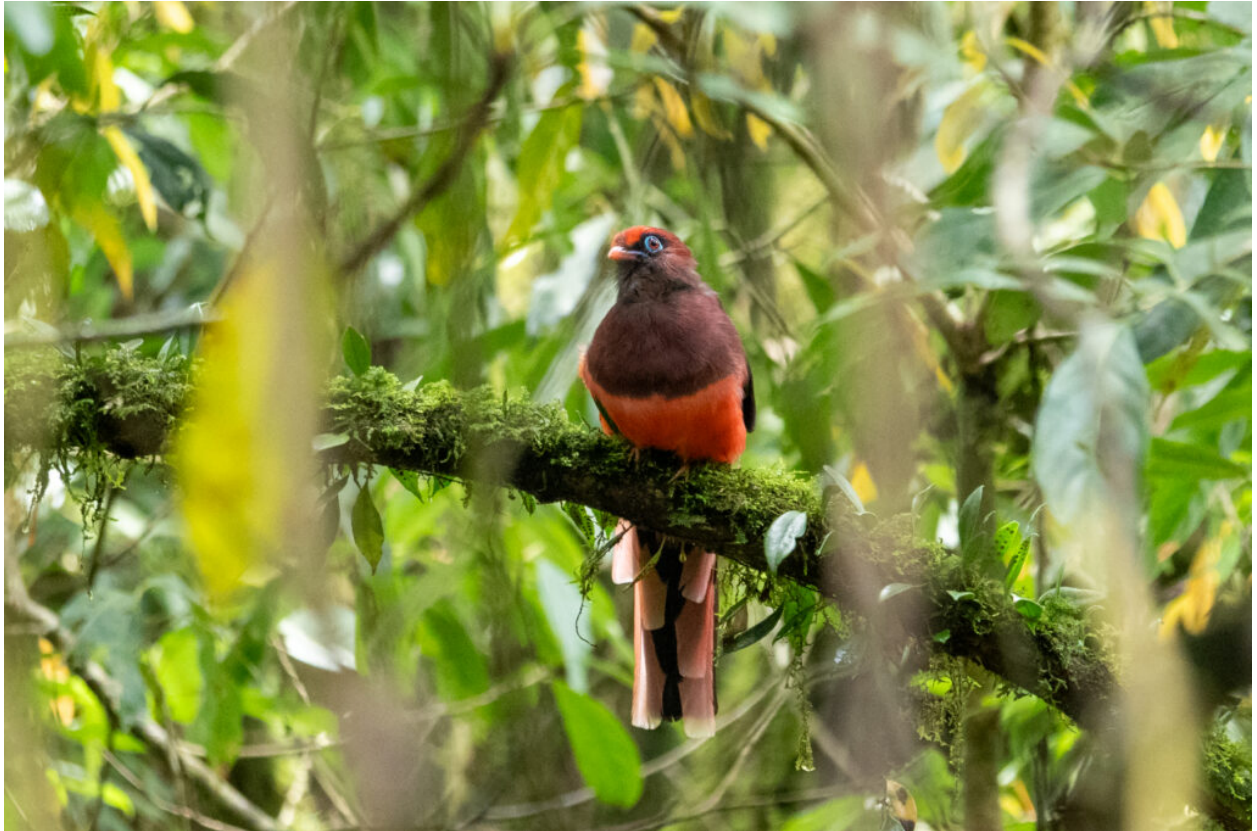
Ward's Trogon