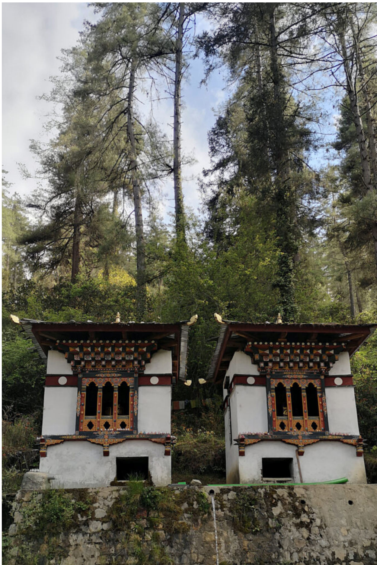
Chortens, Chele La.