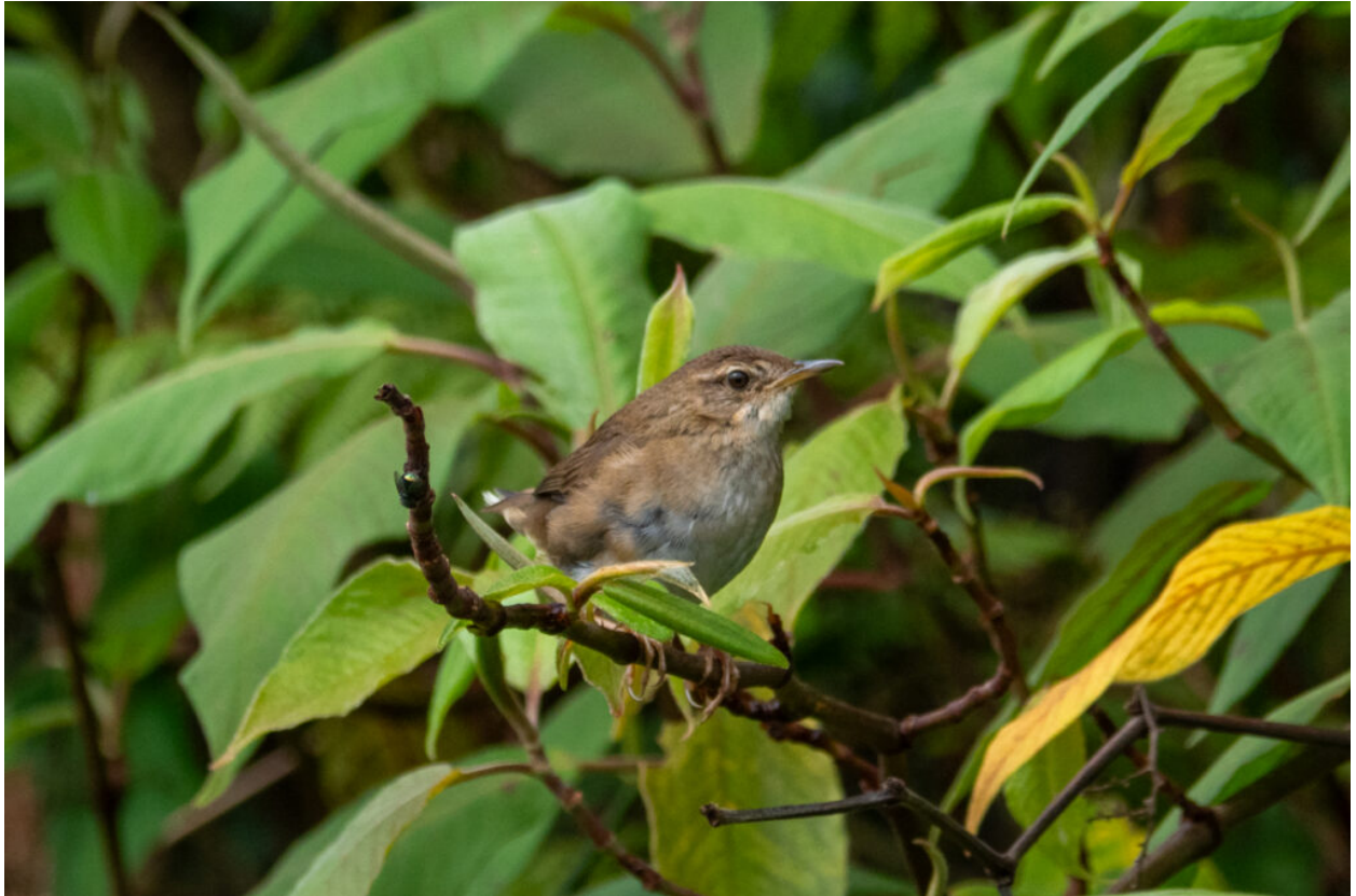
West Himalayan Bush Warbler