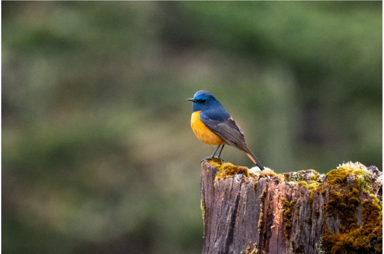
Blue-fronted Redstart