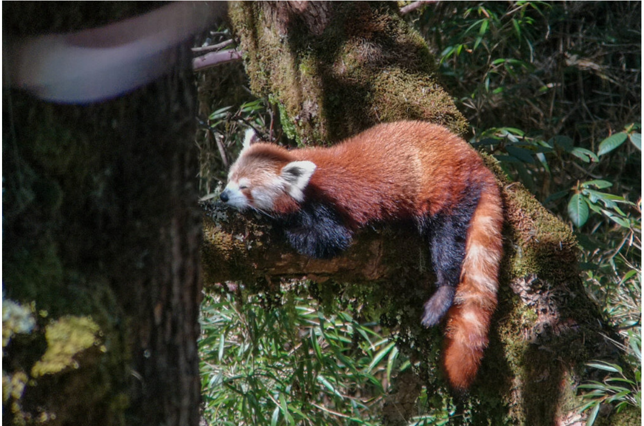
Red Panda