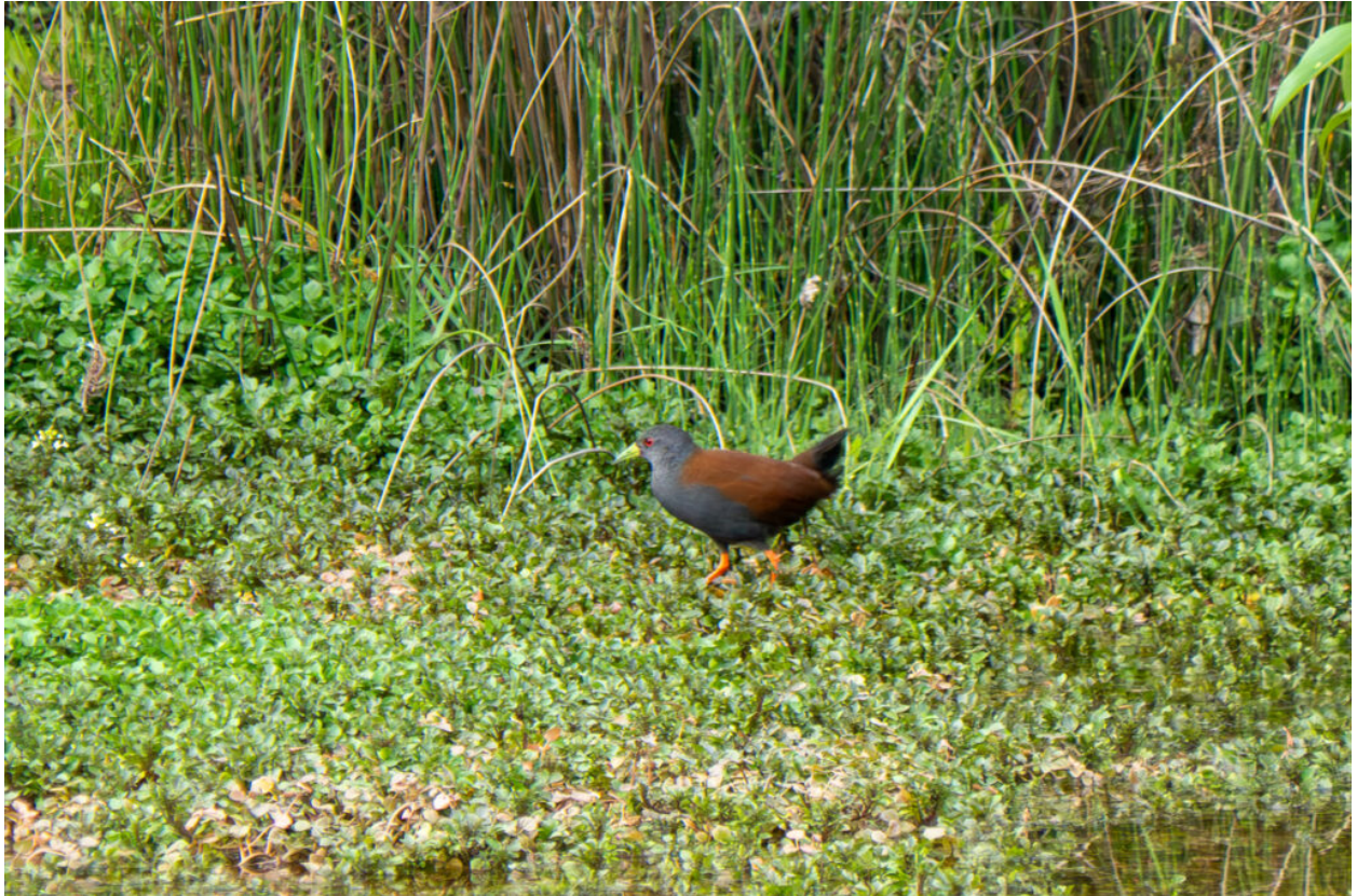
Black-tailed Crake