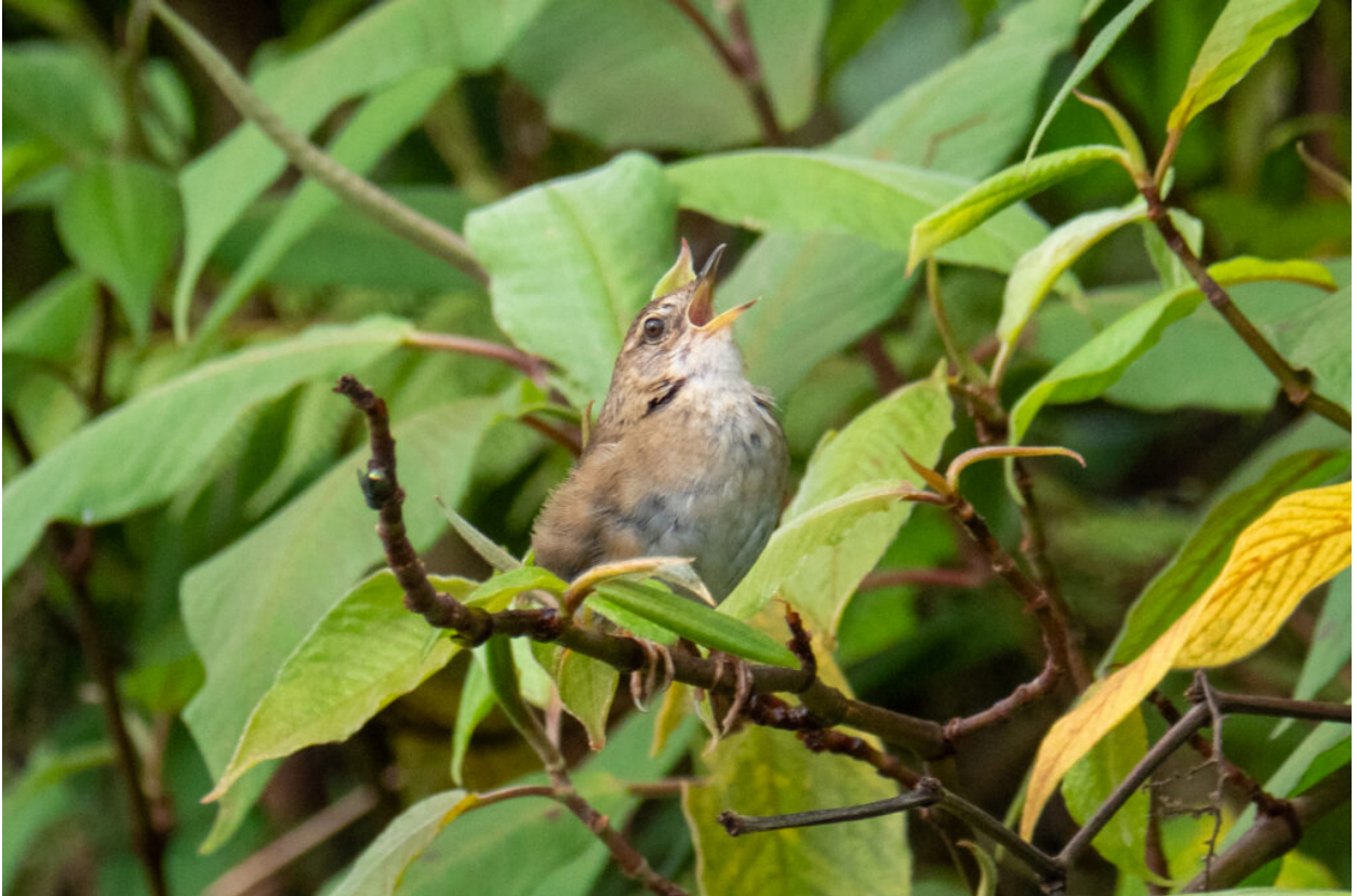
West Himalayan Bush Warbler