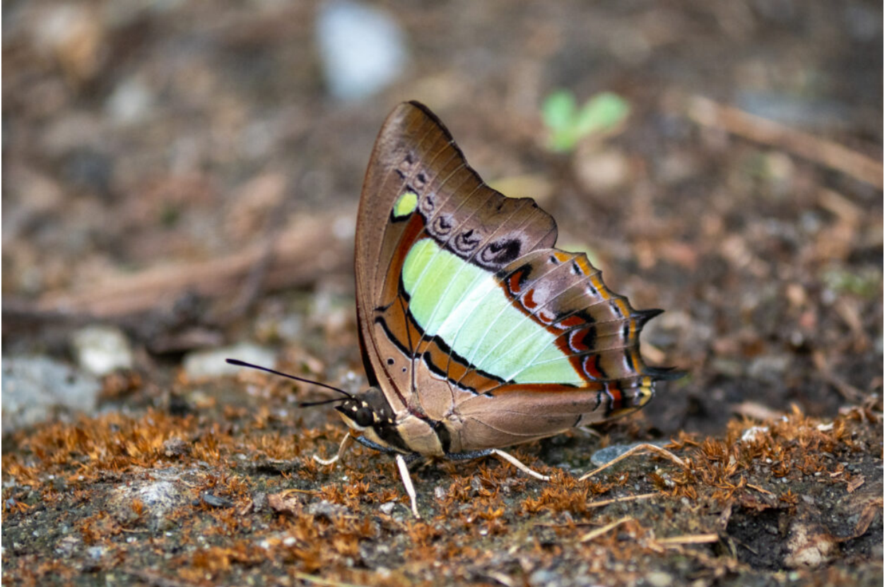
Common Nawab