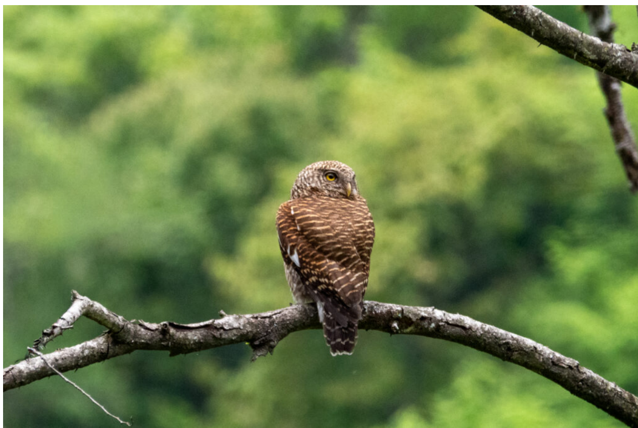
Asian Barred Owlet