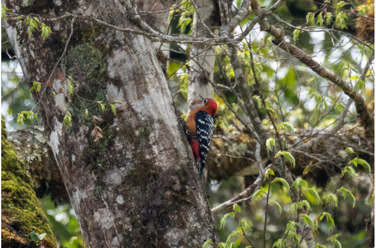
Rufous-bellied Woodpecker