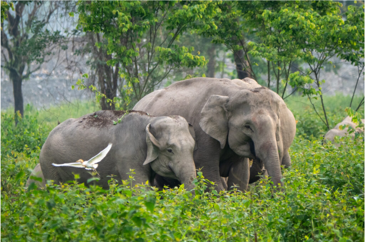
Asian Elephants