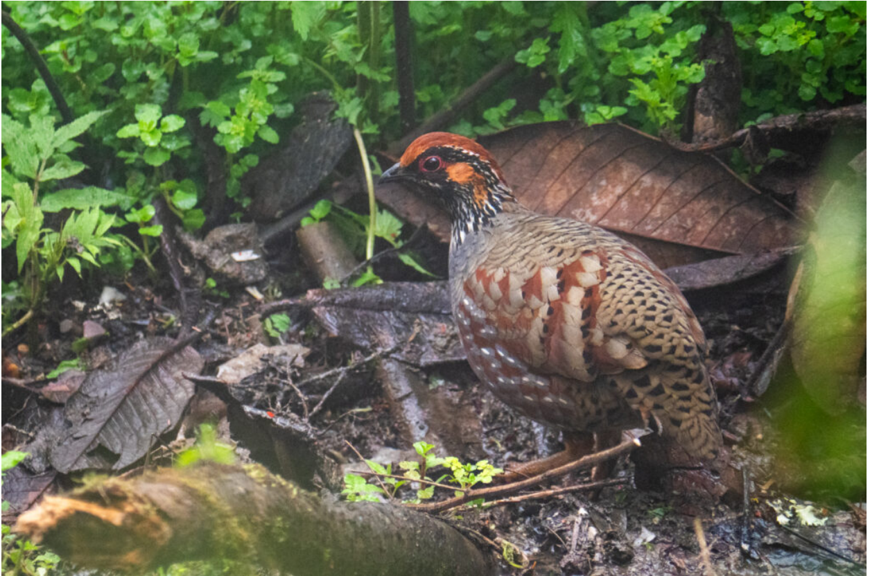
Hill Partridge