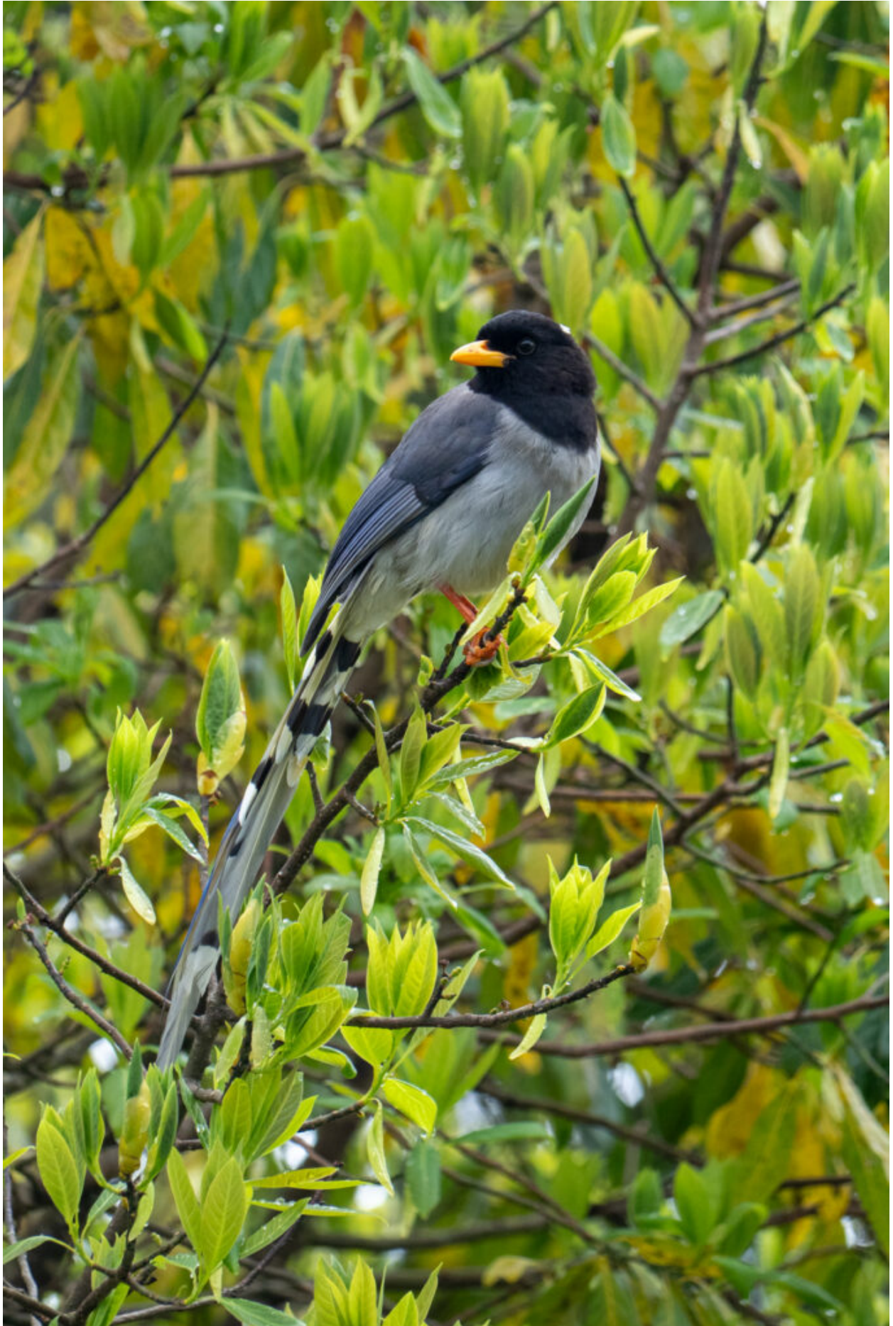
Yellow-billed Blue Magpie