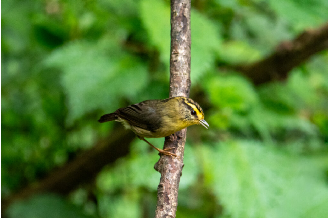
Yellow-throated Fulvetta