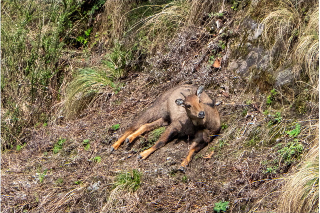
Brown Goral