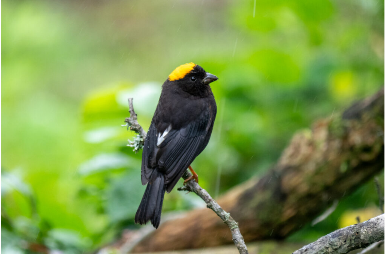
Golden-naped Finch