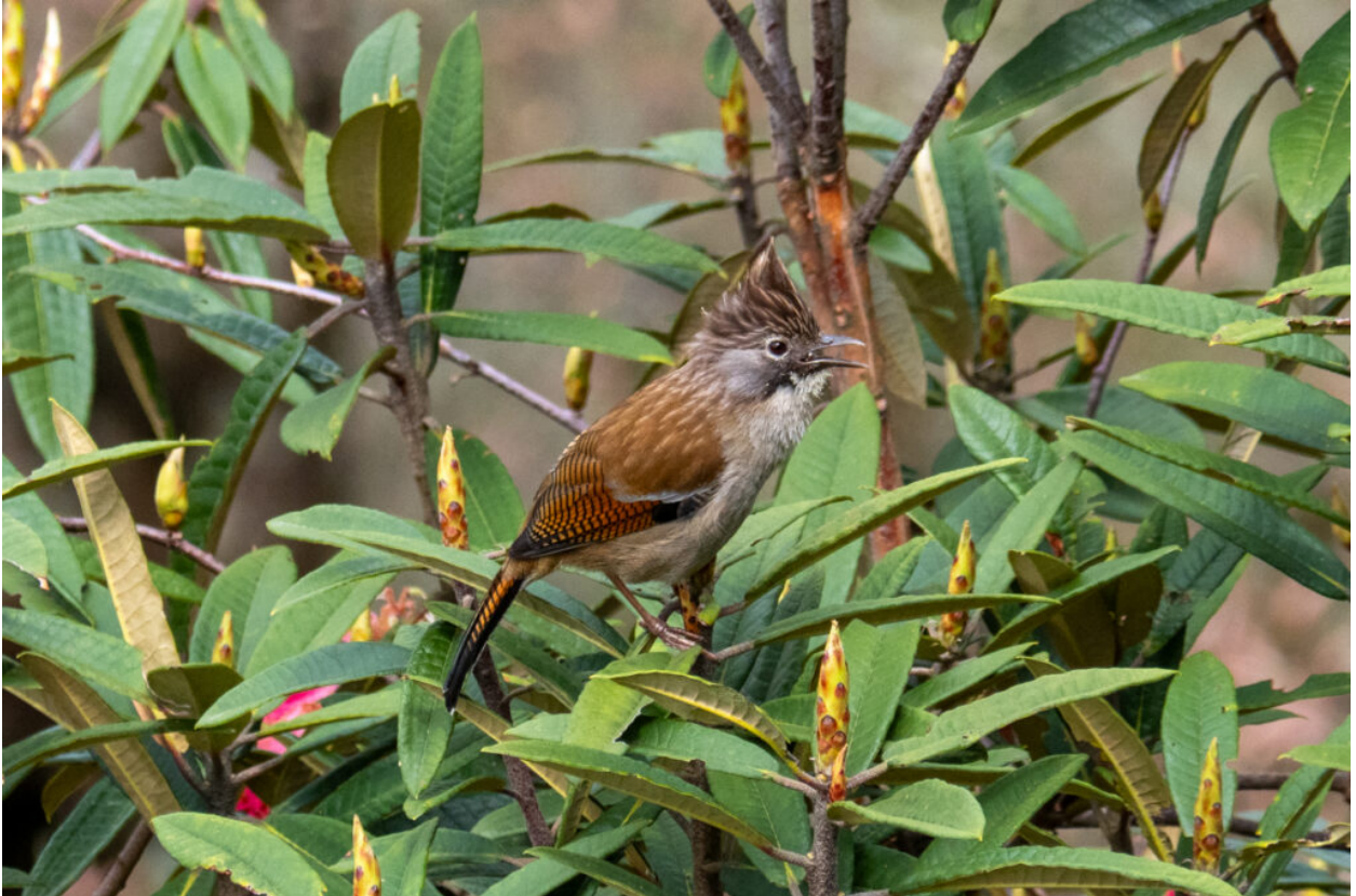
Hoary-throated Barwing