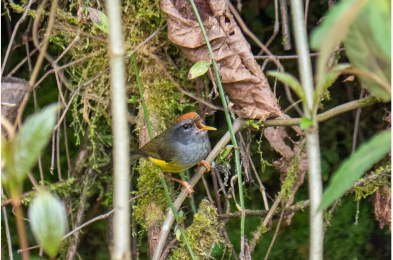
Broad-billed Warbler