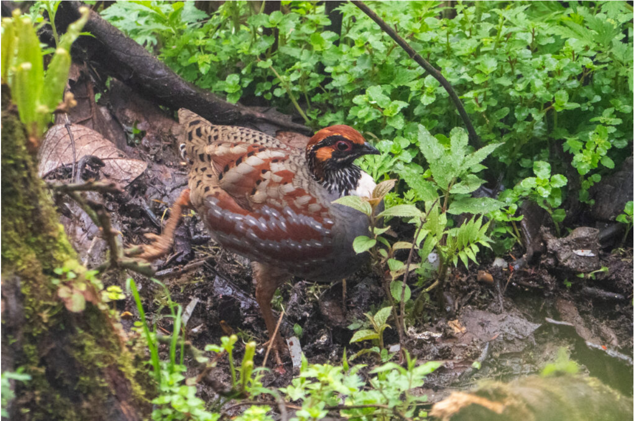
Hill Partridge