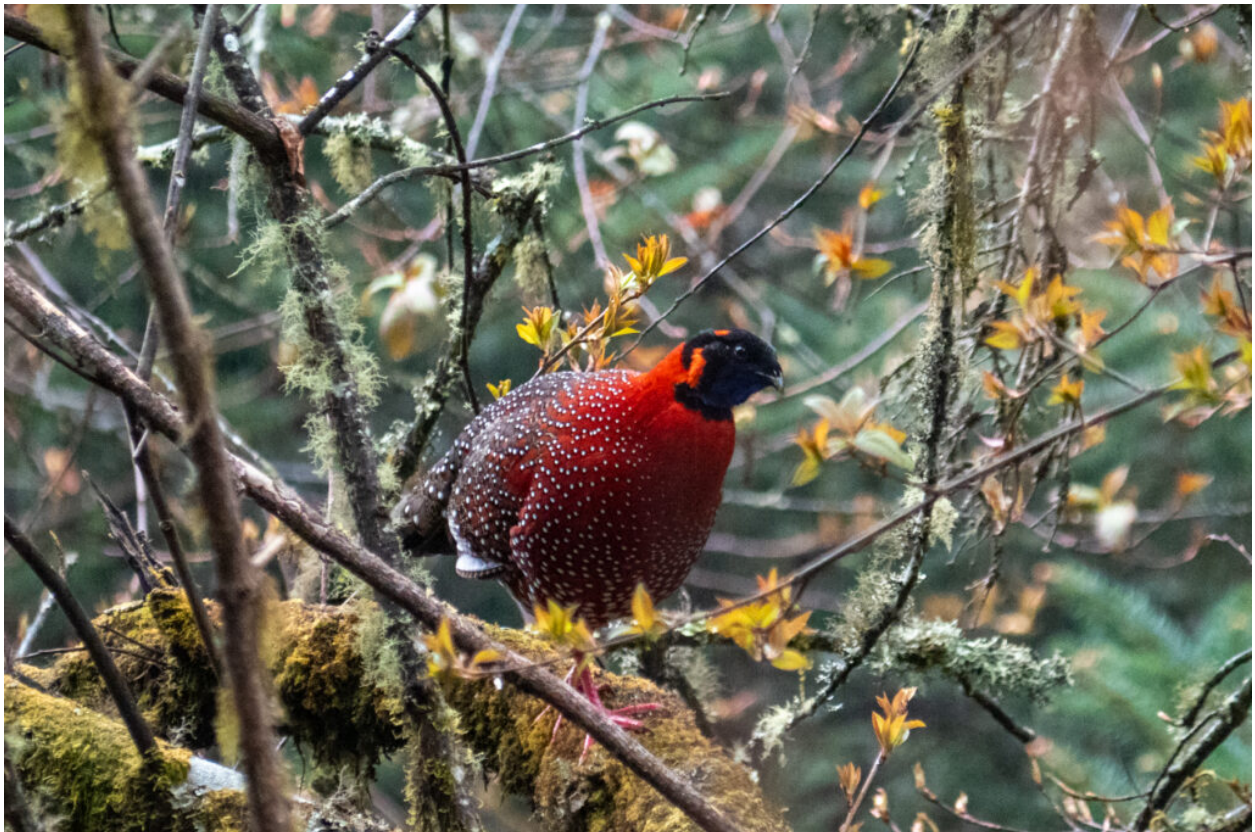
Satyr Tragopan

Himalayan Striped Squirrel Tamiops maclellandii