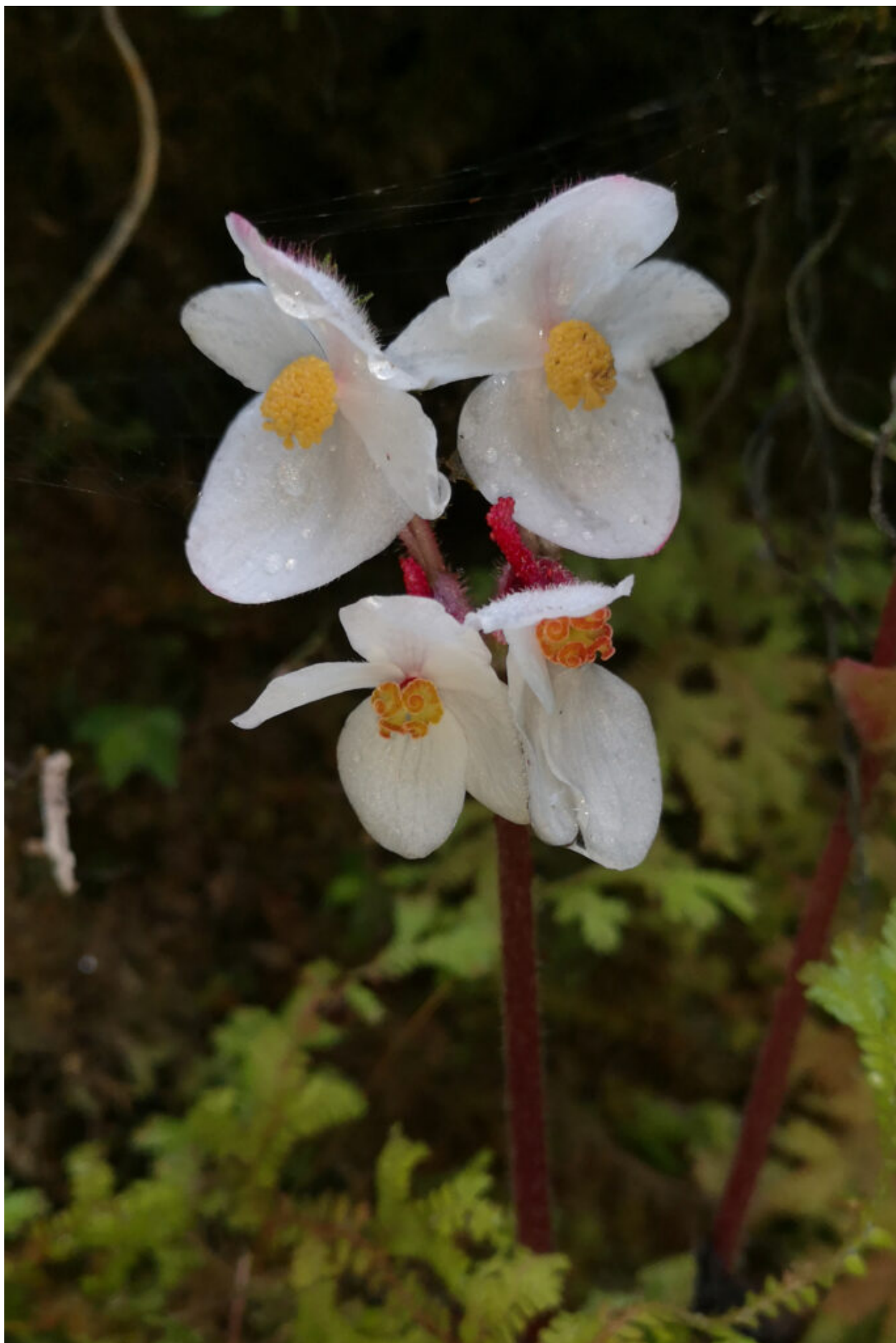
Begonia (image by Dave Farrow)