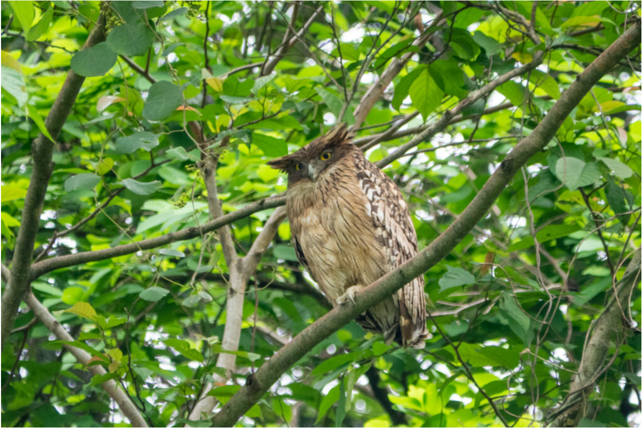
Brown Fish Owl