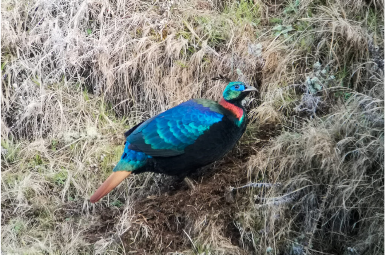
Himalayan Monal