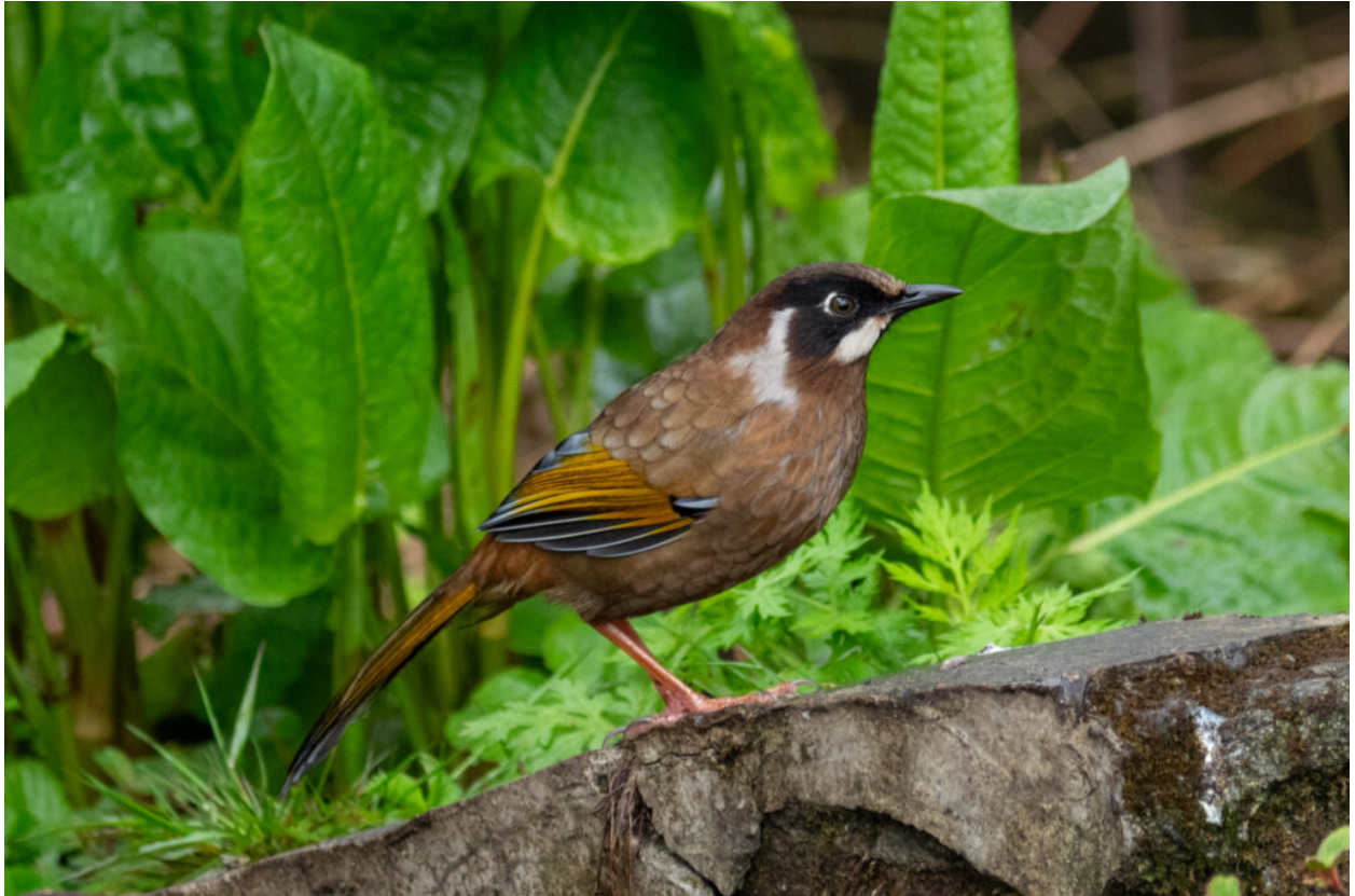
Black-faced Laughingthrush