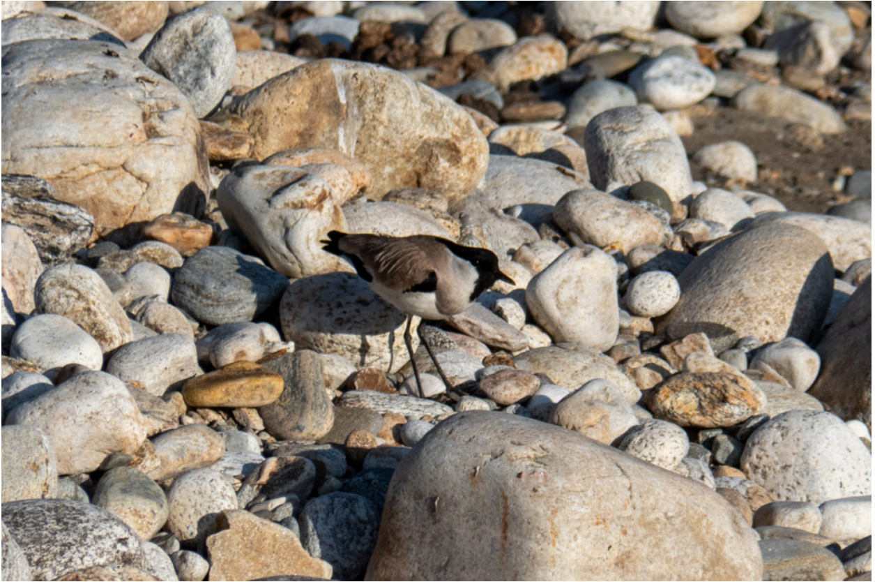
River Lapwing