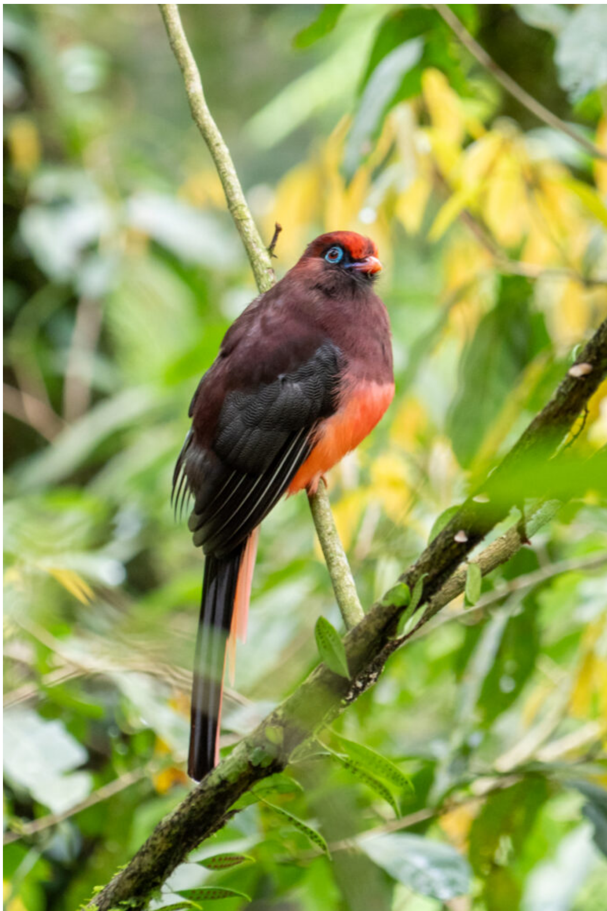
Ward's Trogon