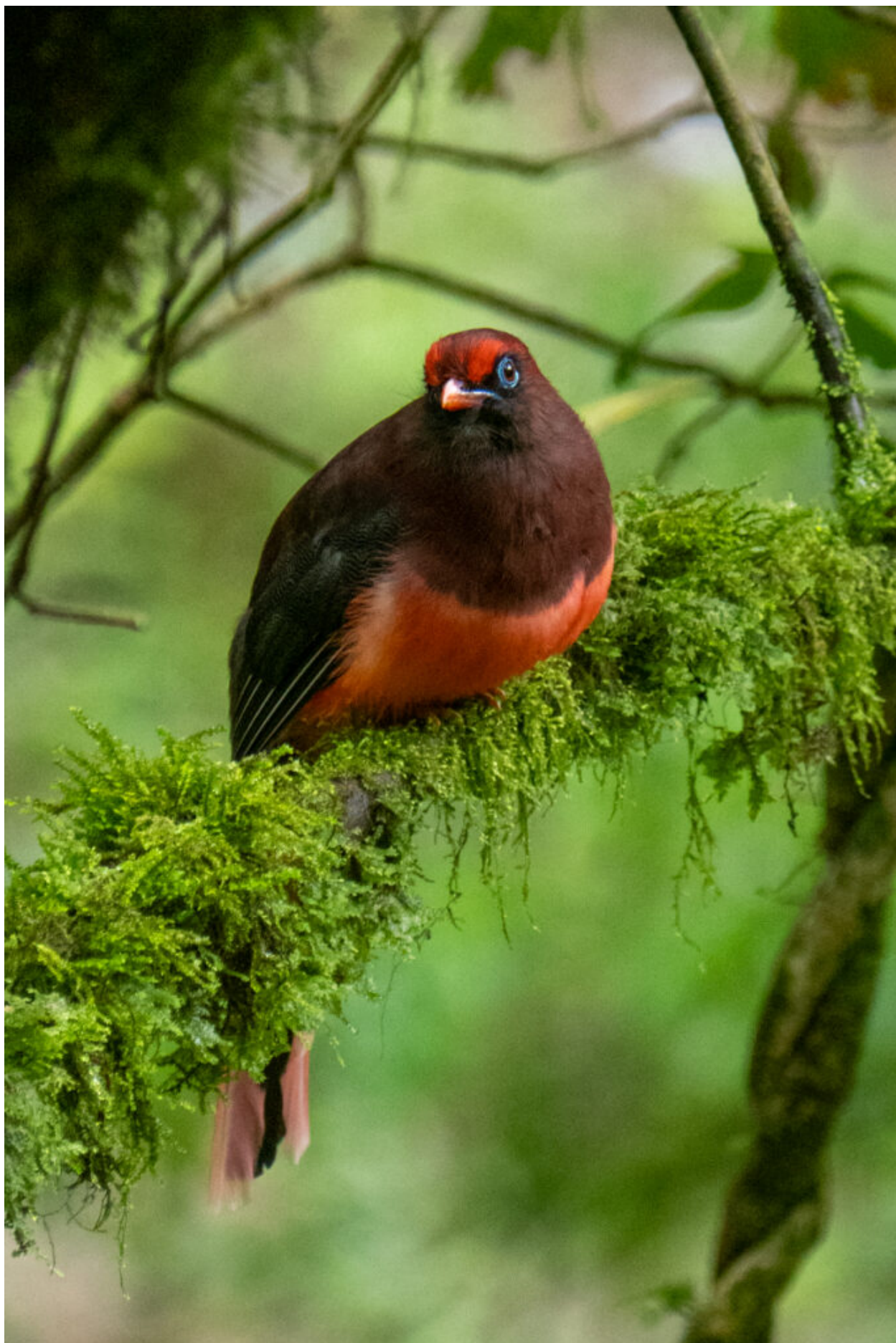
Ward's Trogon