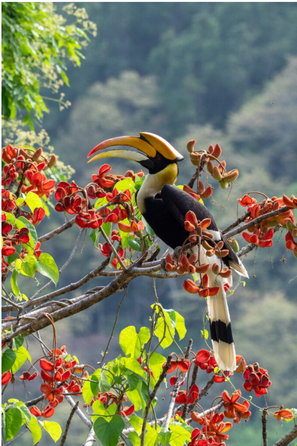
Great Hornbill