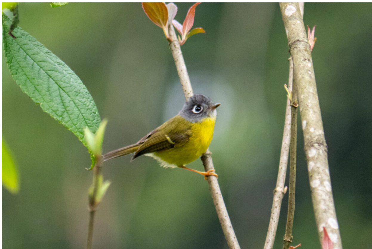
Grey-cheeked Warbler