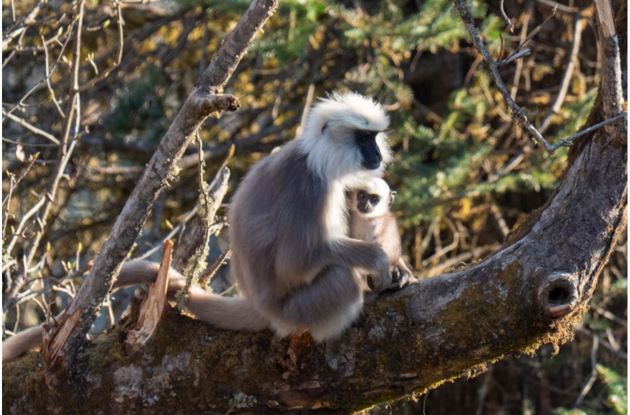
Grey Langurs