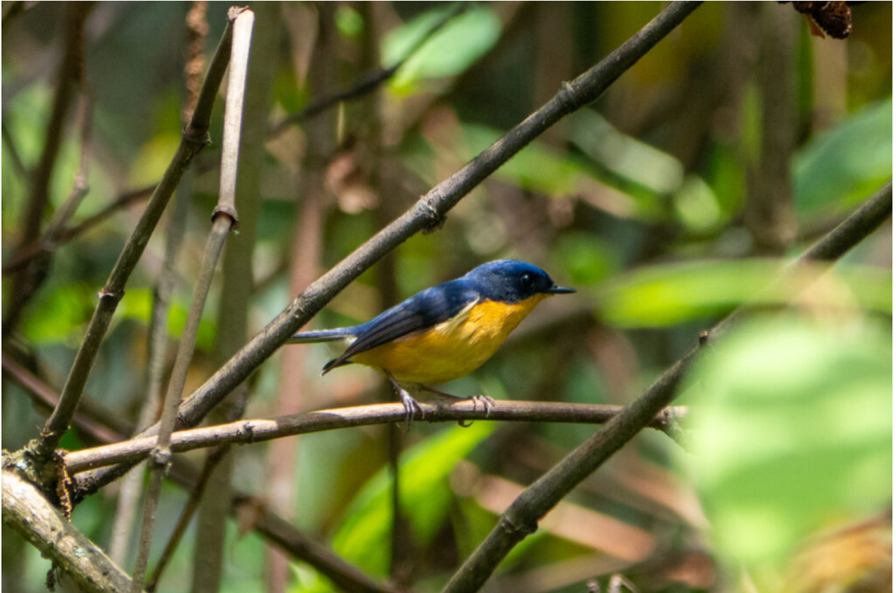
Pygmy Flycatcher