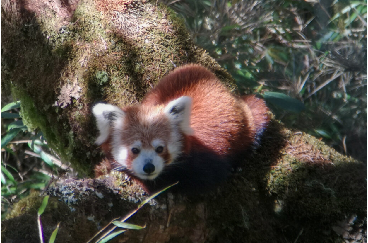
Red Panda