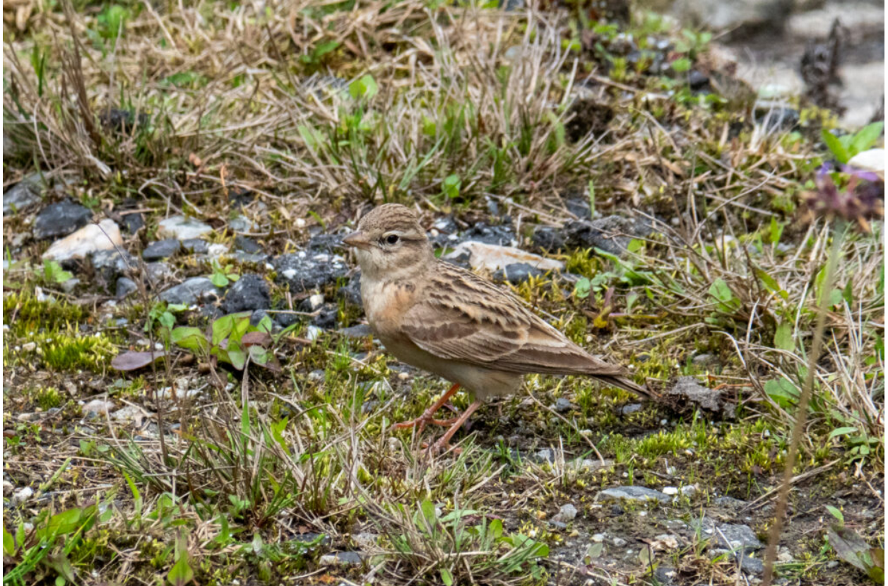
Mongolian Short-toed Lark