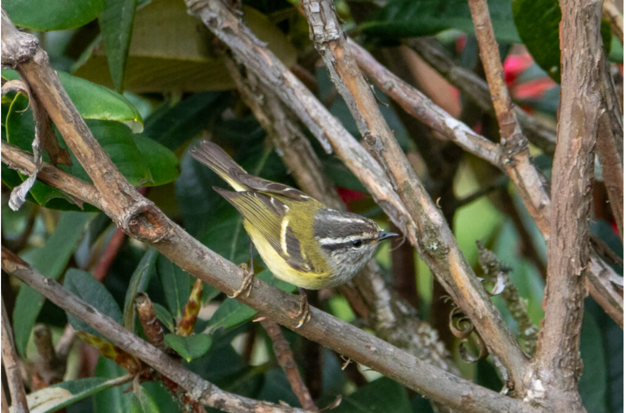
Ashy-throated Warbler