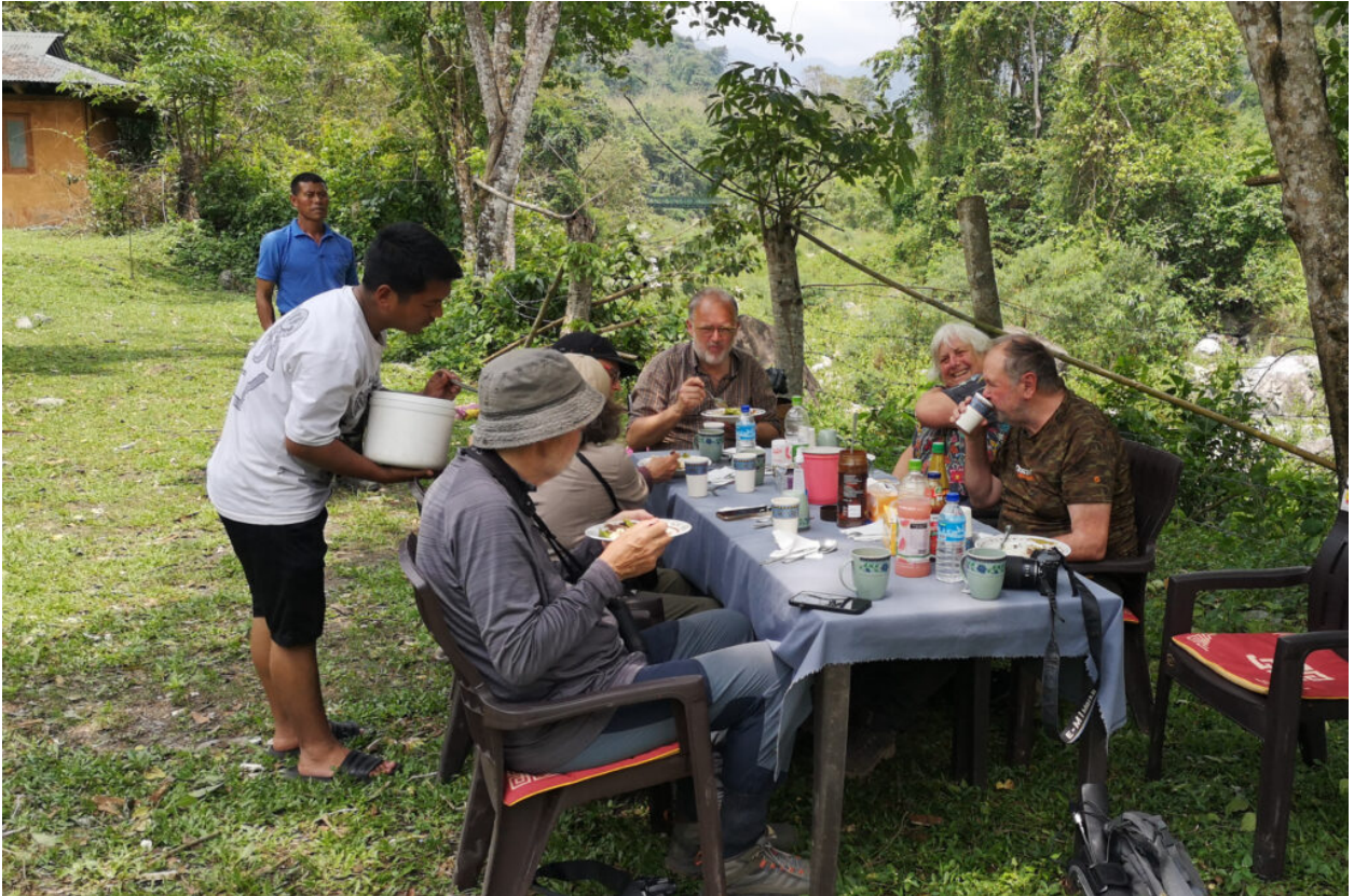
Group lunch