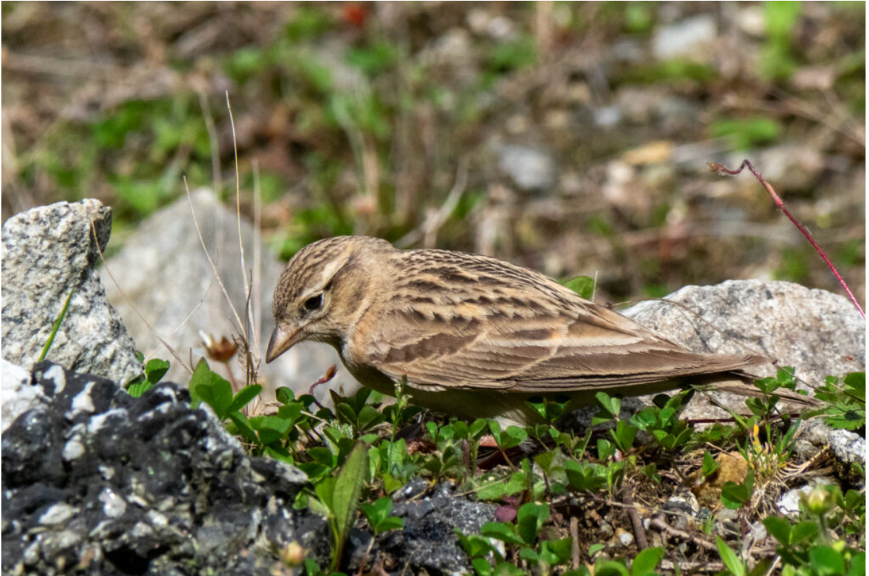
Mongolian Short-toed Lark