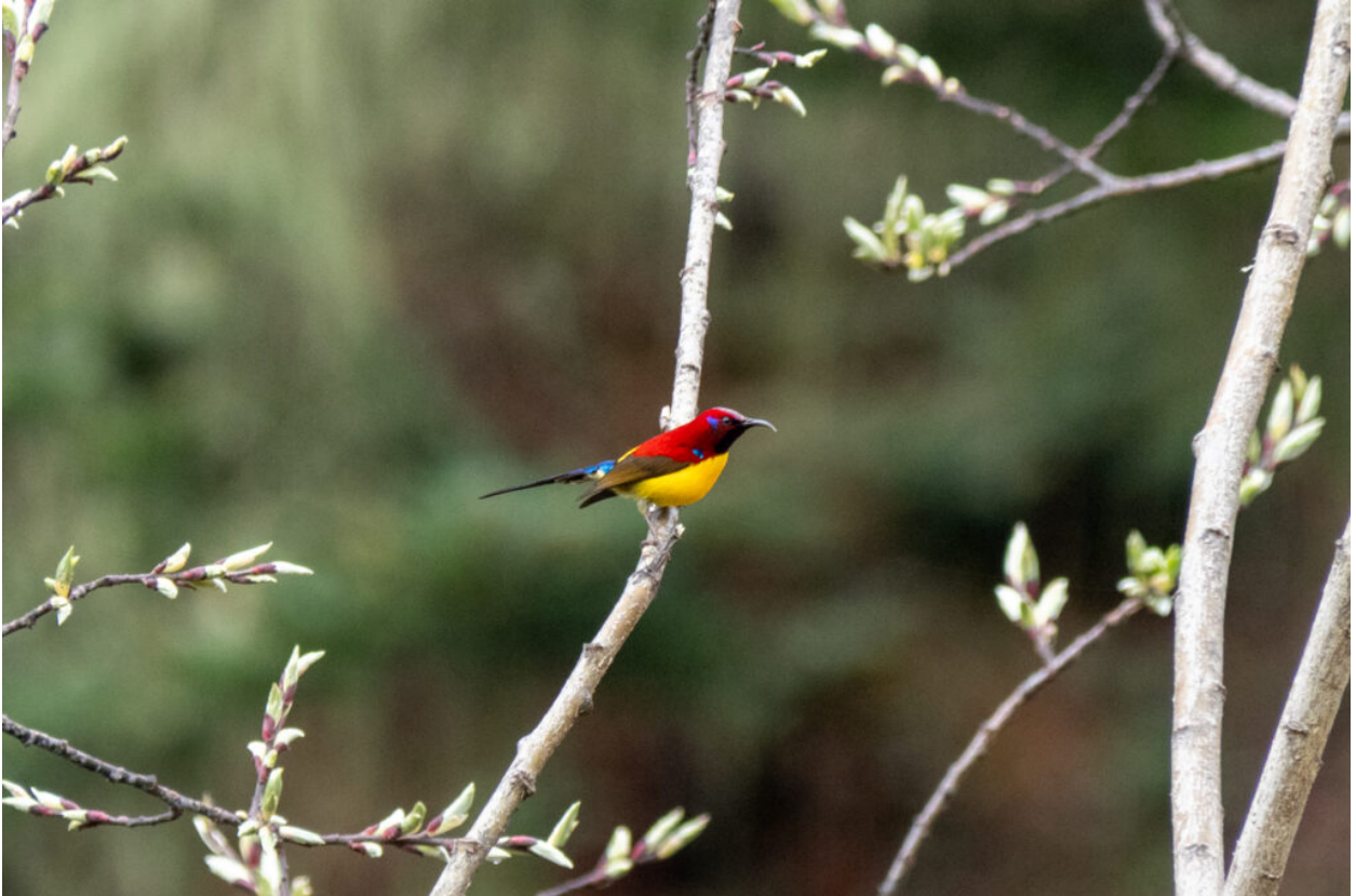
Mrs Gould's Sunbird