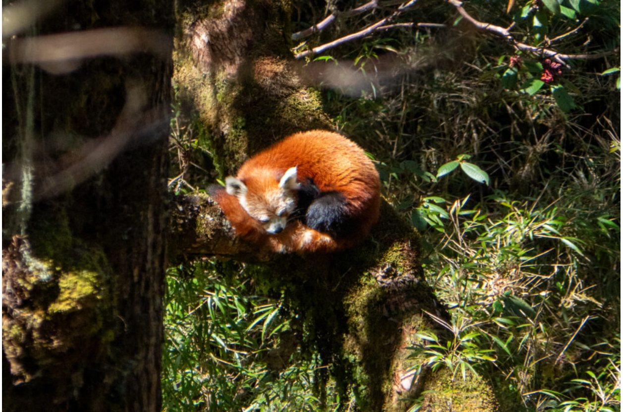
Red Panda