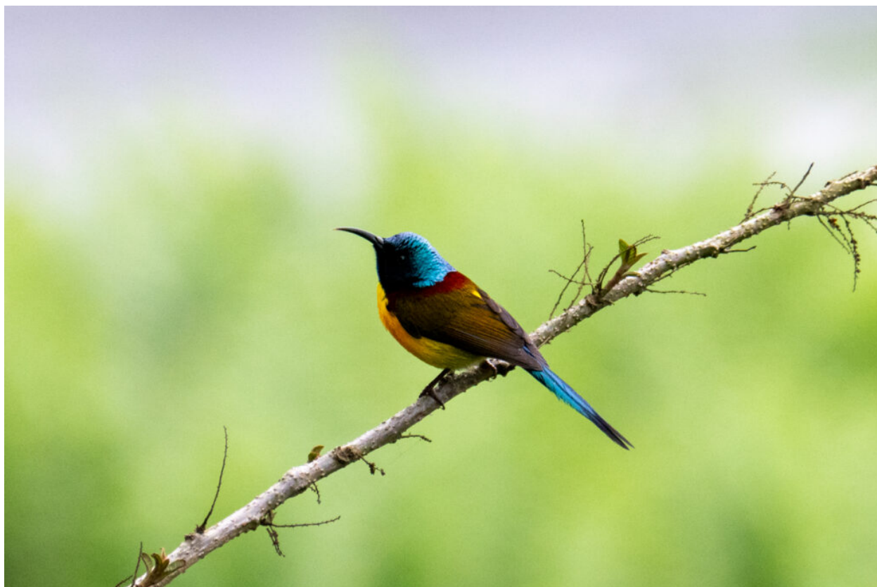
Green-tailed Sunbird