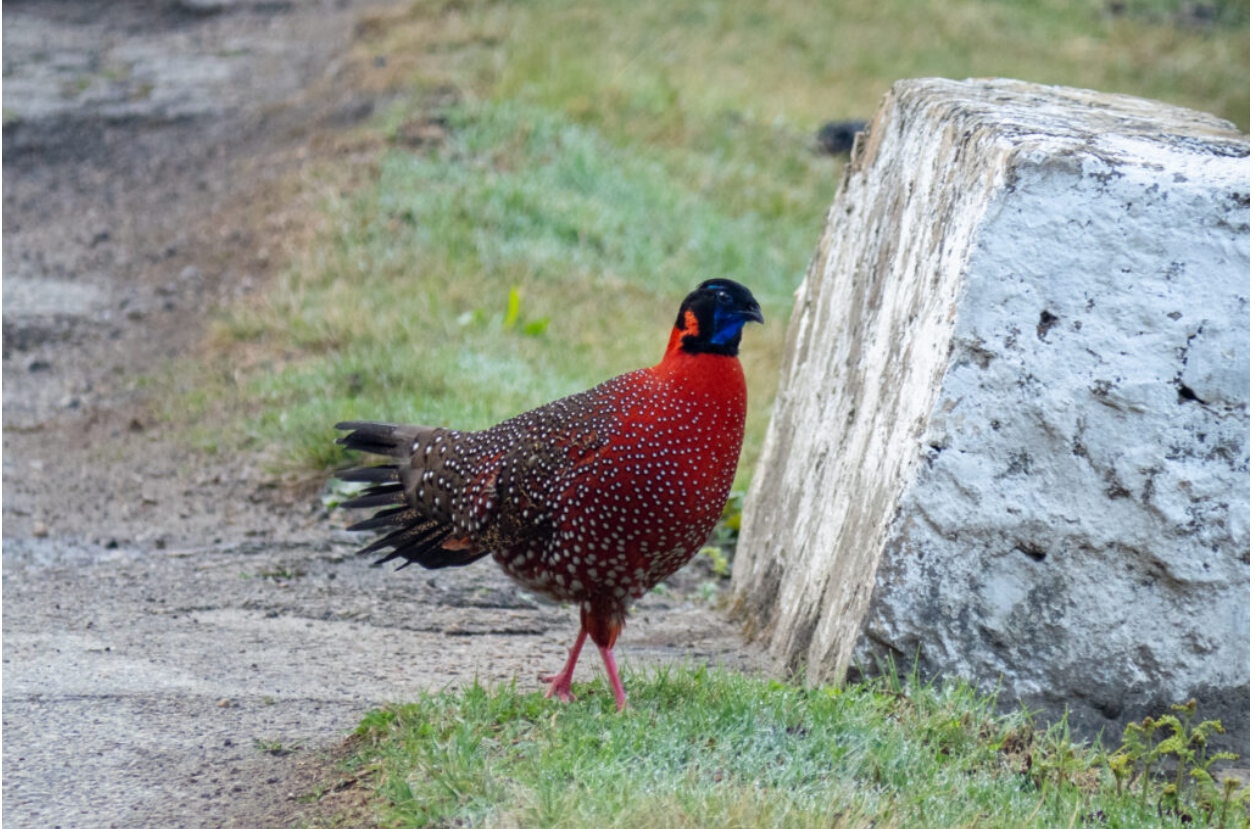
Satyr Tragopan