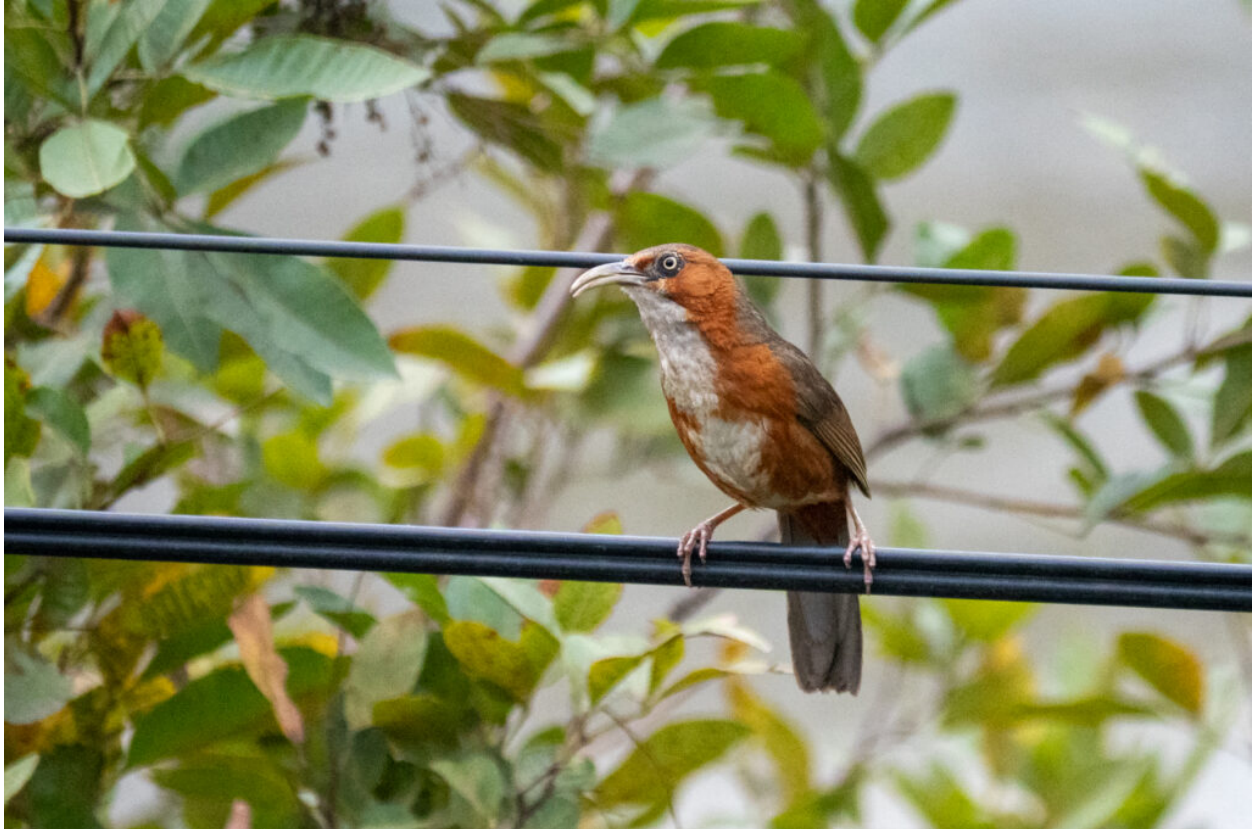
Rusty-cheeked Scimitar Babbler