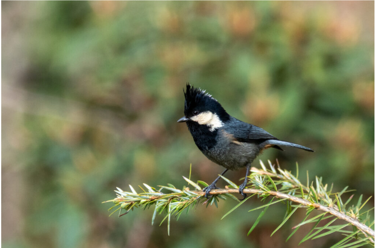
Rufous-vented Tit