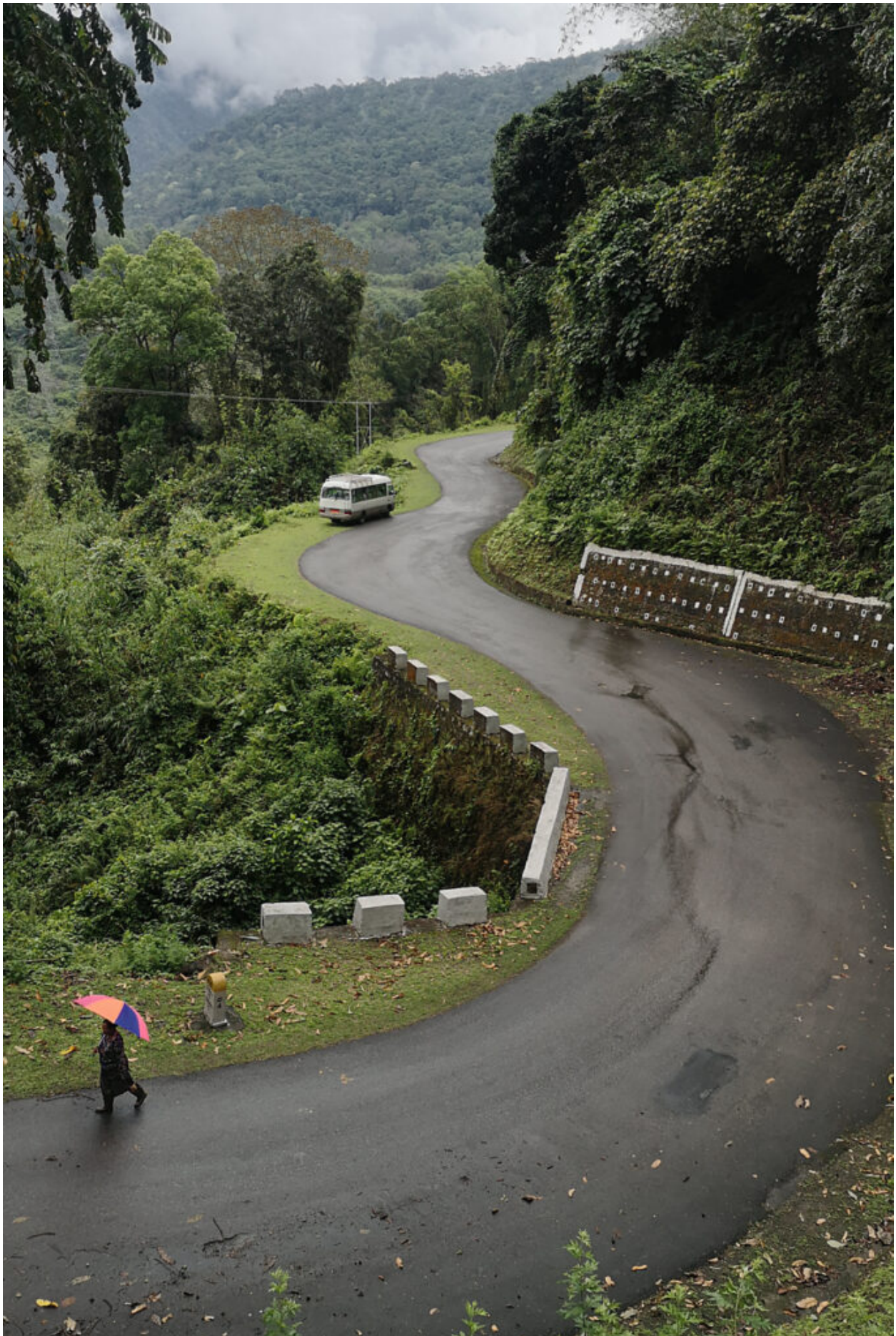
The road to Tingtibi