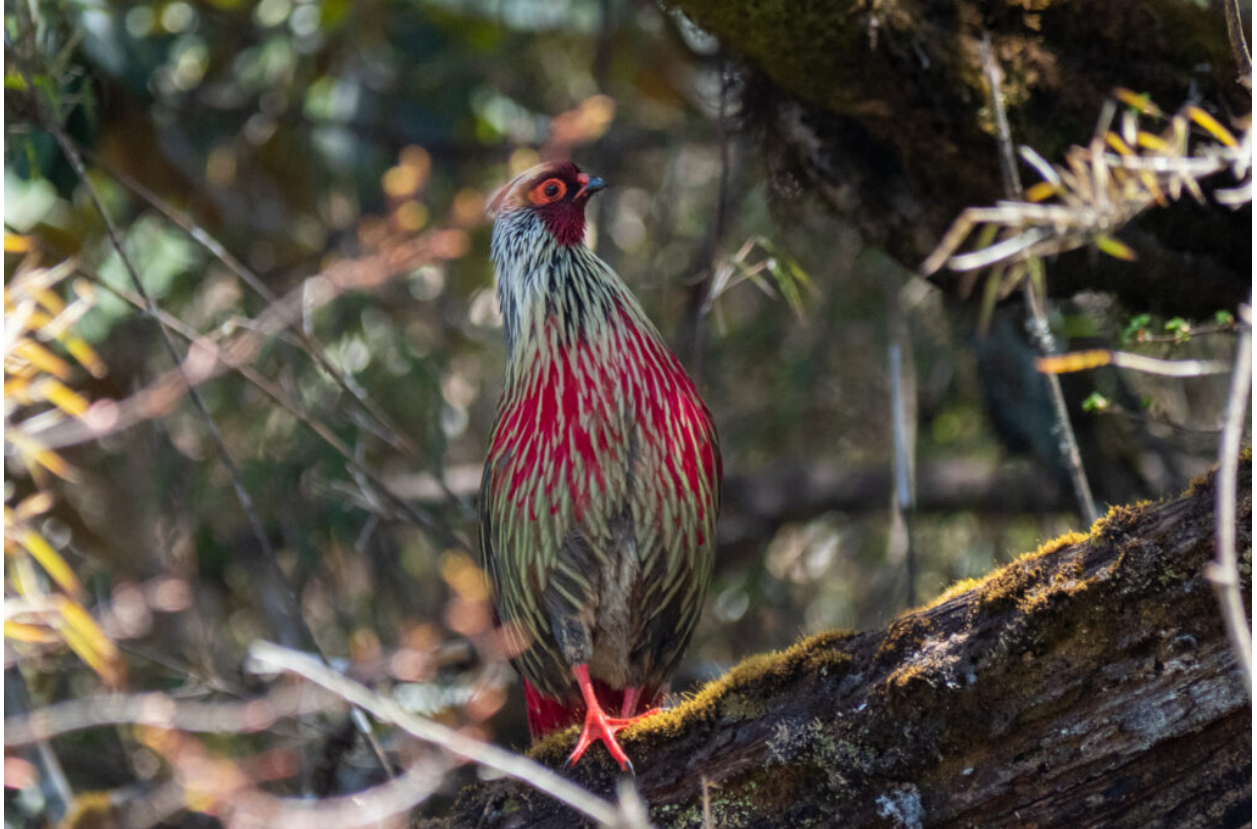
Blood Pheasant