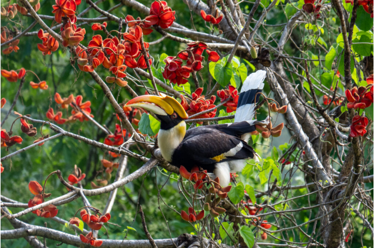
Great Hornbill