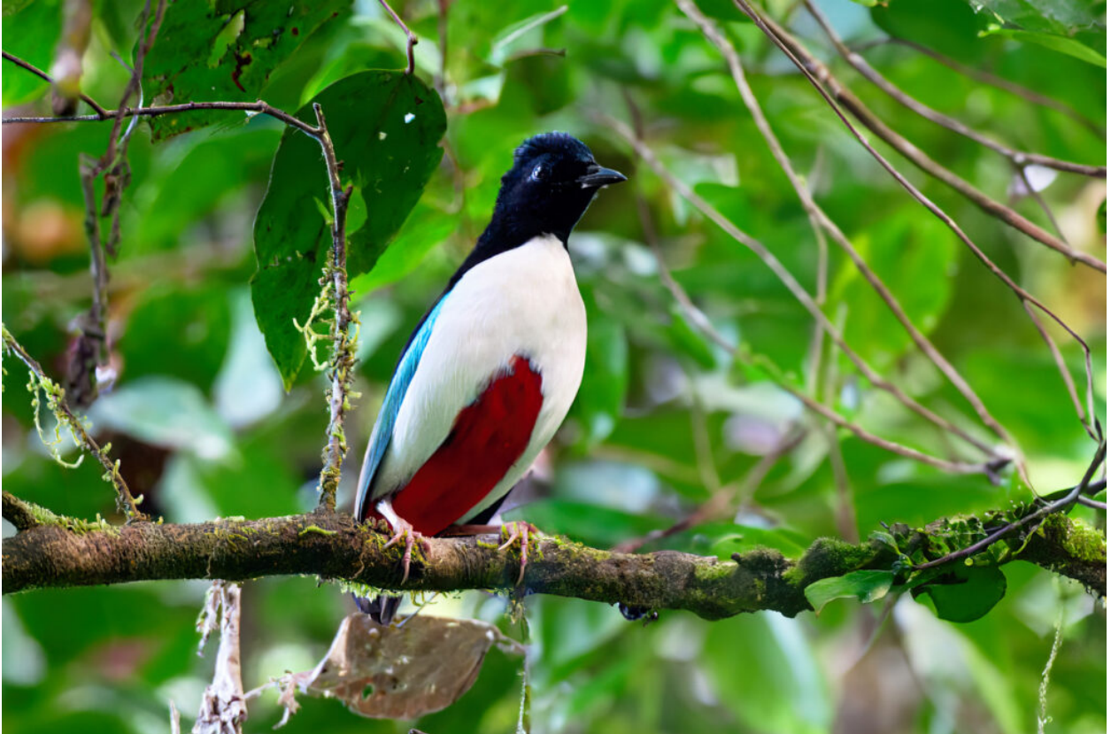
Ivory-breasted Pitta