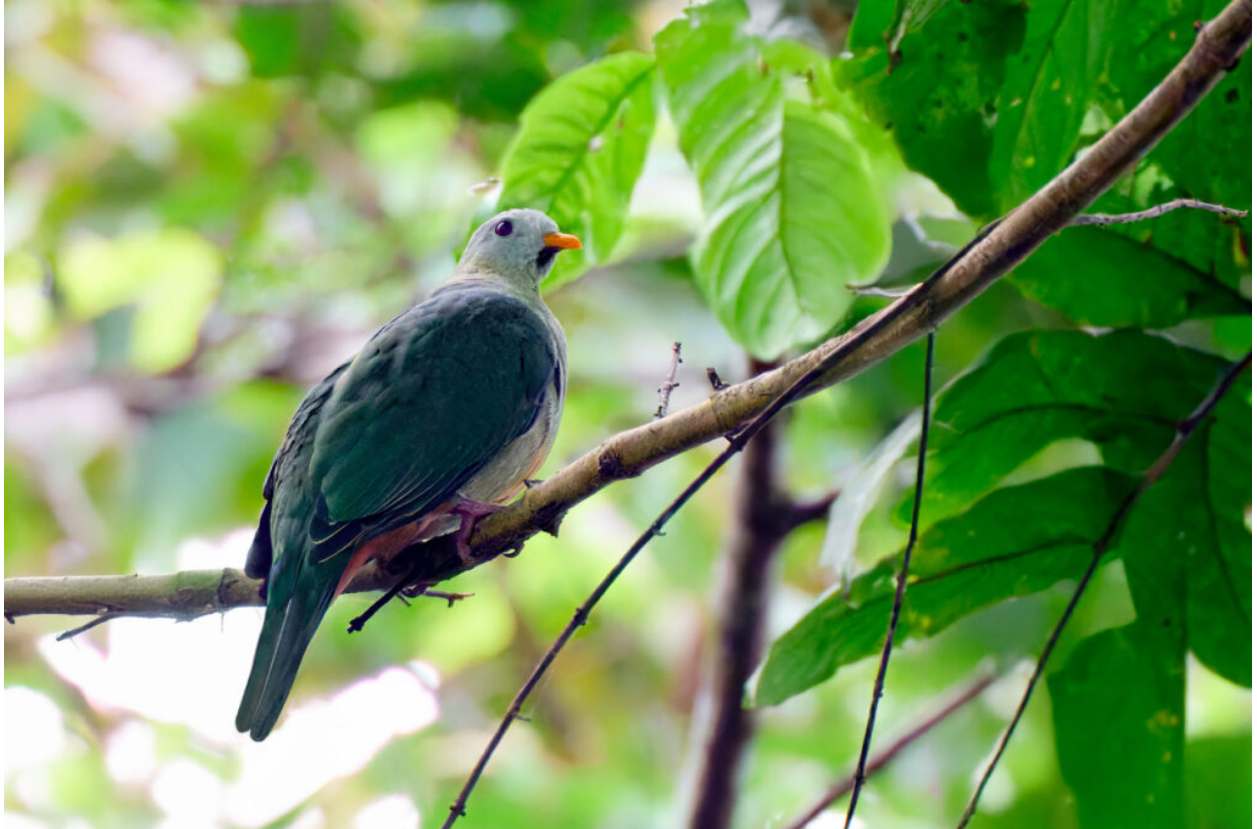
Oberholser's Fruit Dove