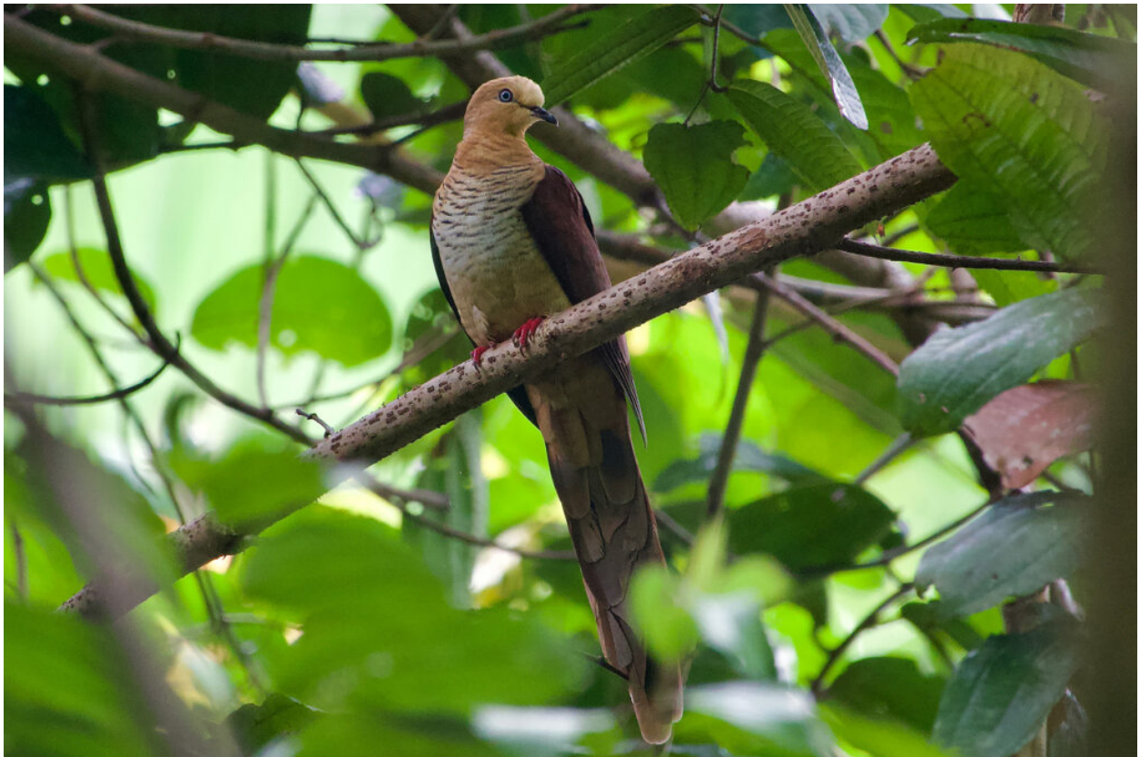
Sulawesi (Sultan's) Cuckoo-Dove