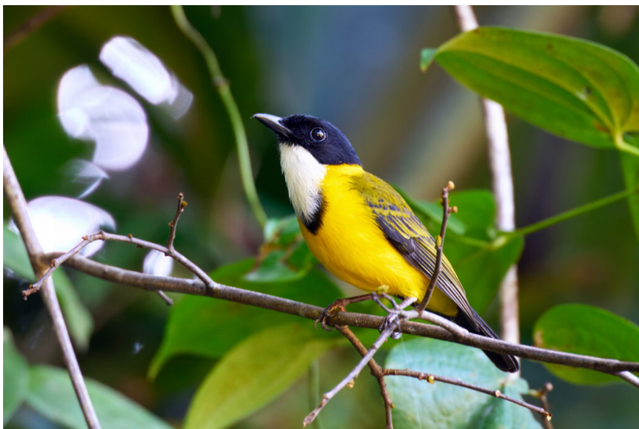
Black-chinned Whistler