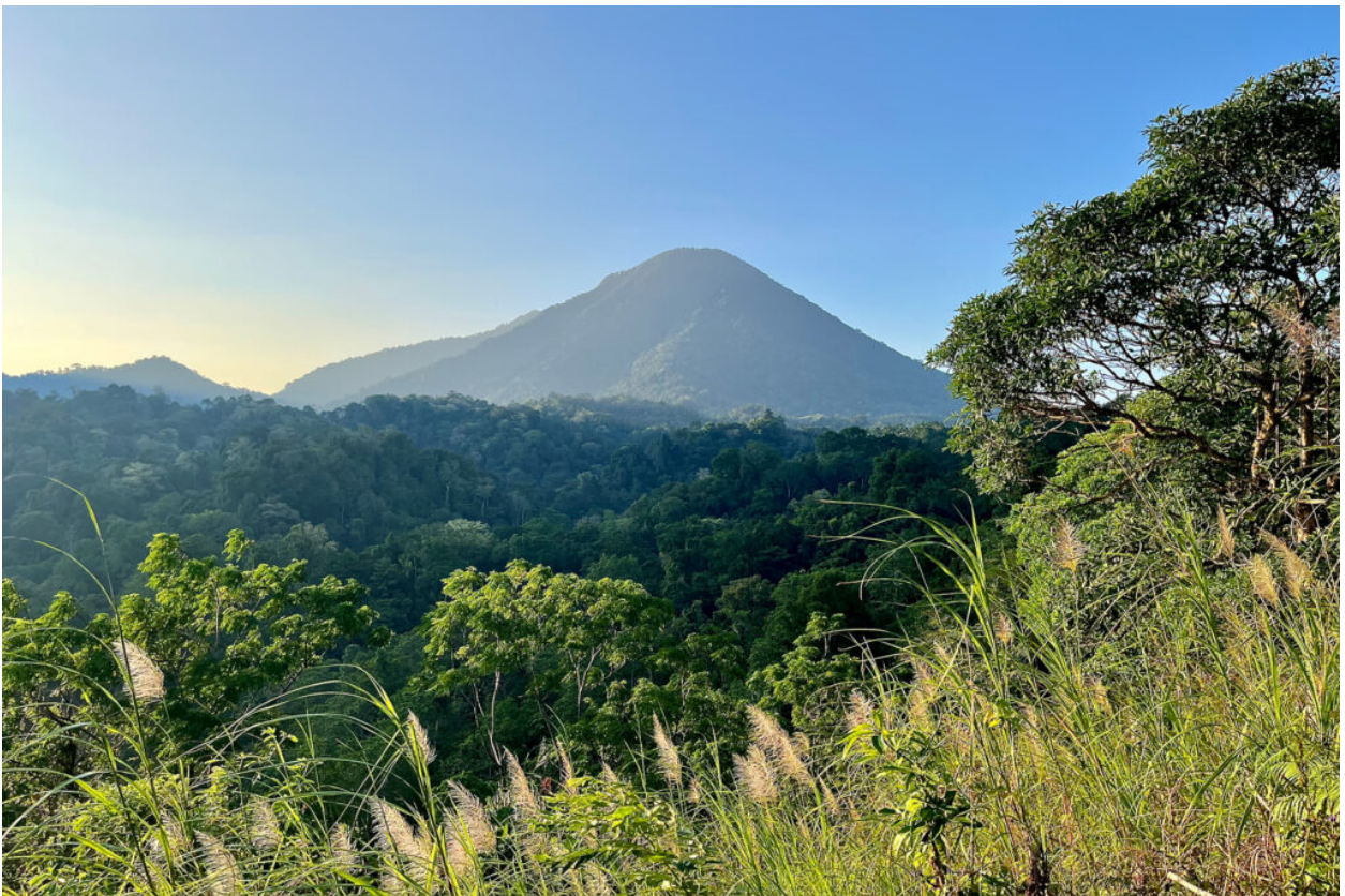
Tangkoko Viewpoint