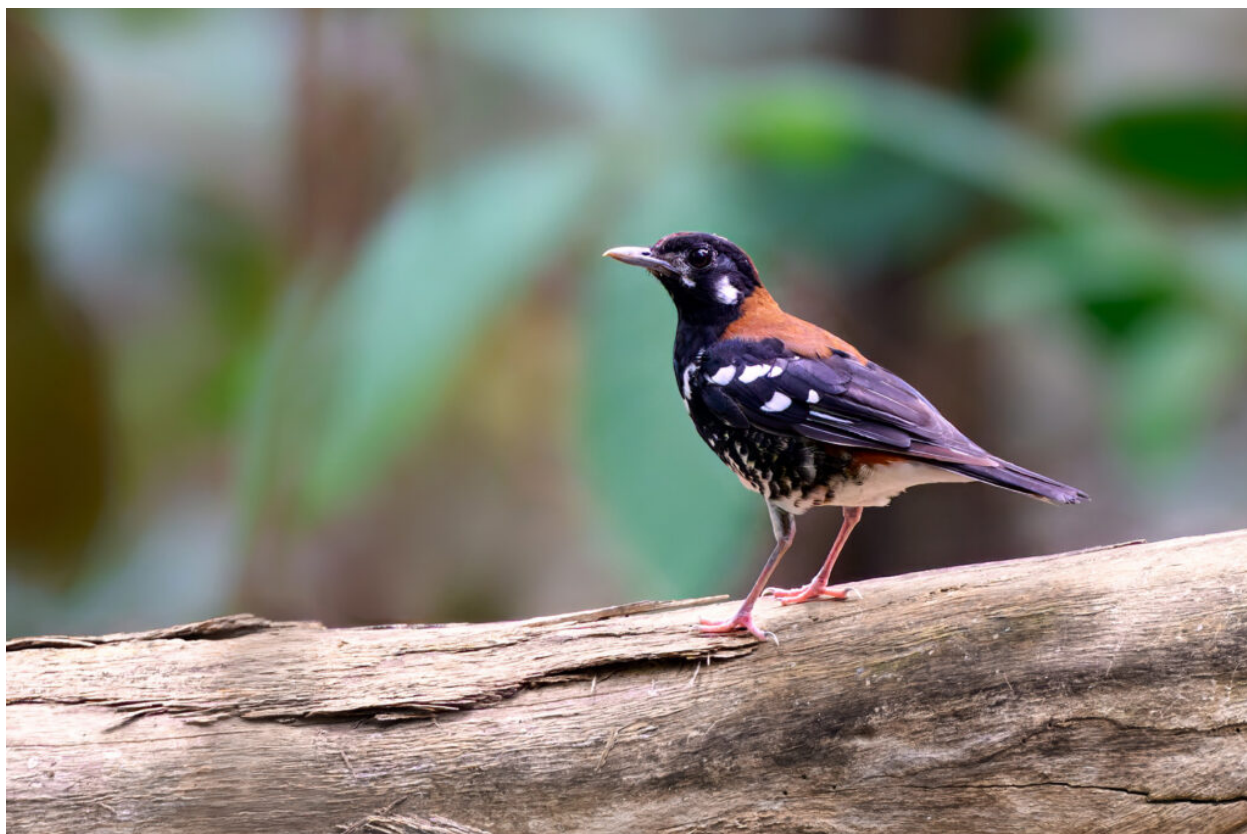
Red-backed Thrush