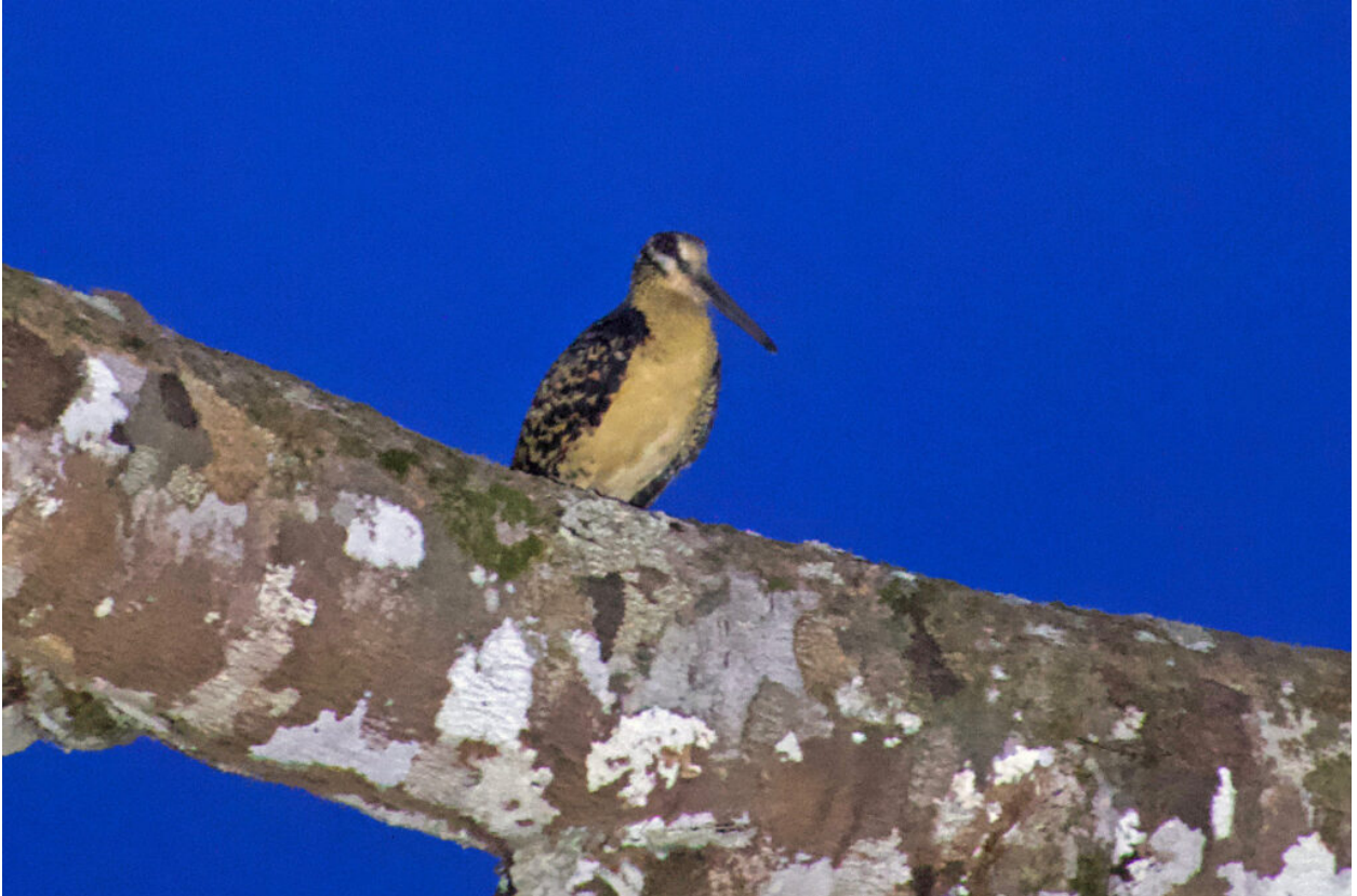
Moluccan Woodcock