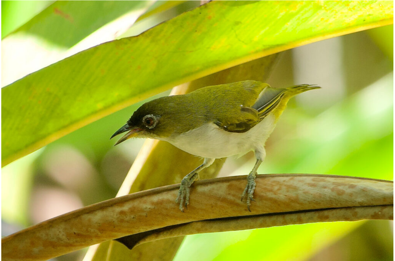
Halmahera White-eye