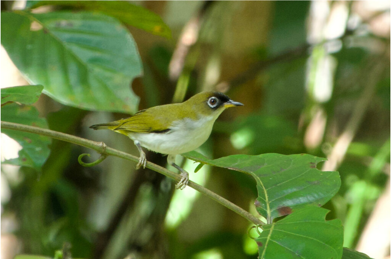
Halmahera White-eye