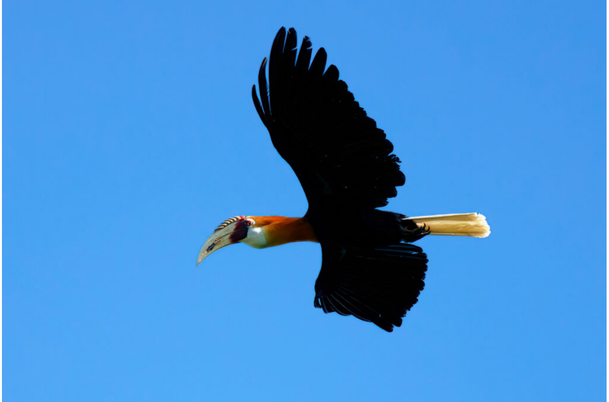
Knobbed Hornbill