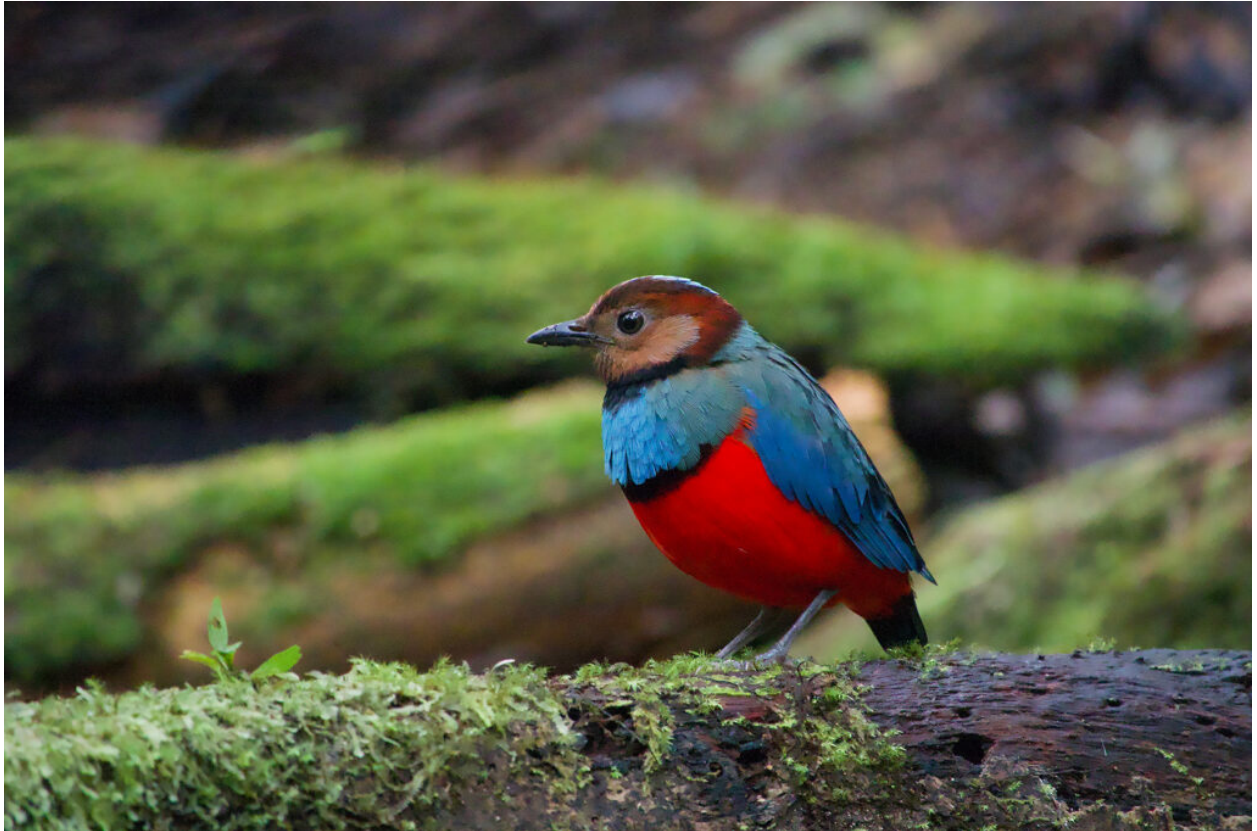
Sulawesi Pitta