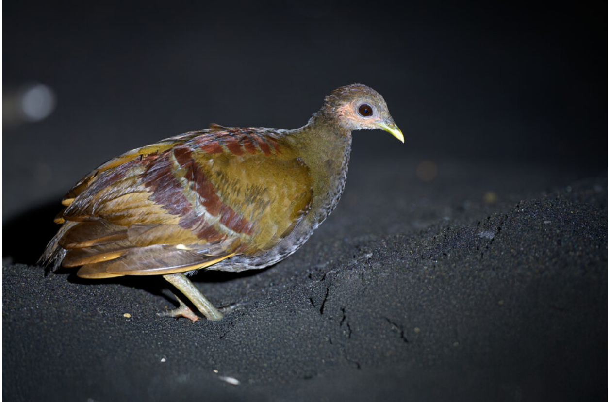
Moluccan Megapode