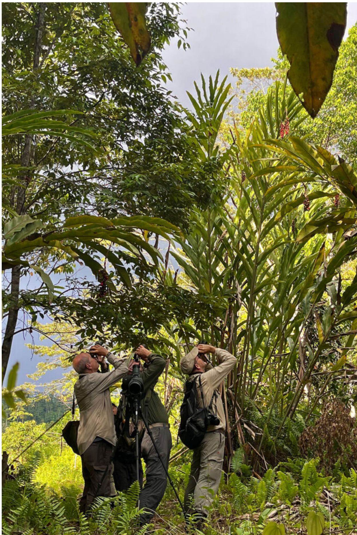
Birding at Buli Road