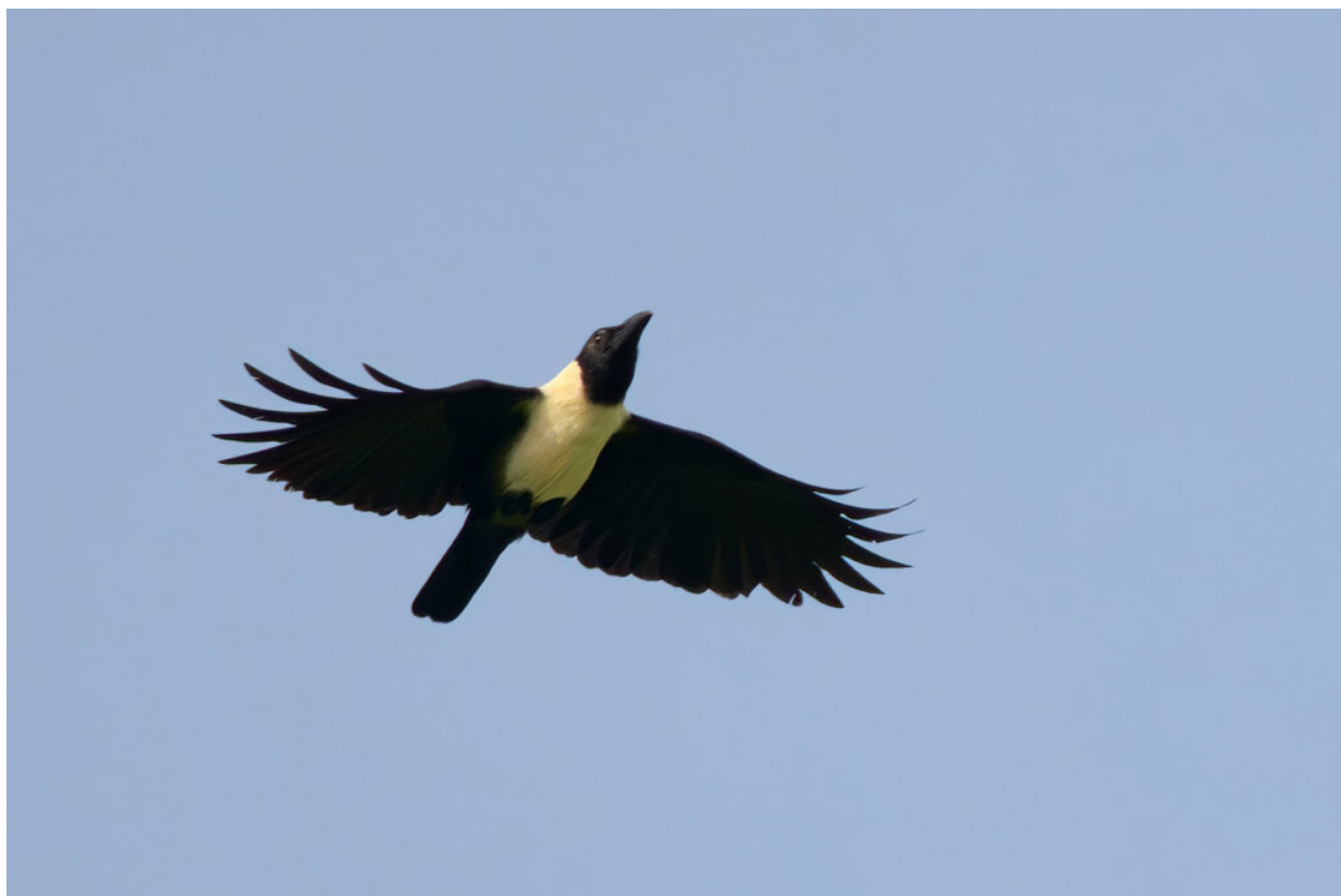
Piping Crow