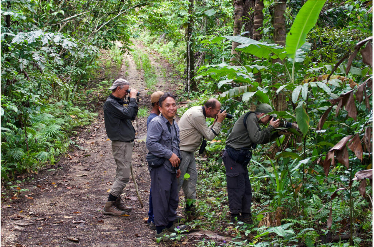
Birding at Foli