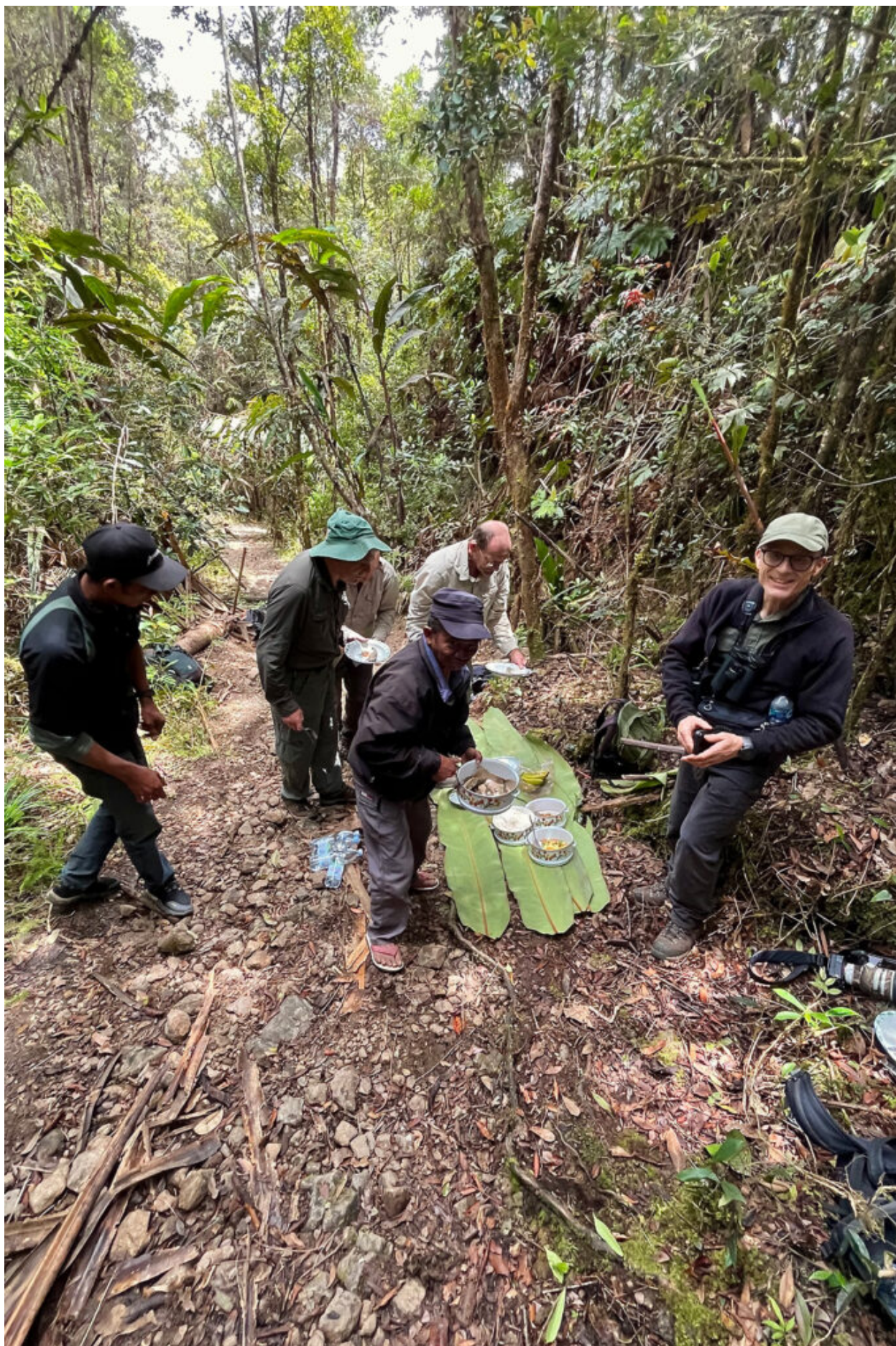
Field lunch at Anaso Track