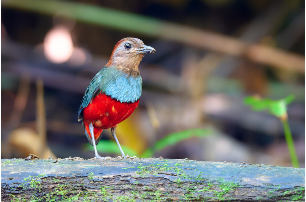
North Moluccan Pitta