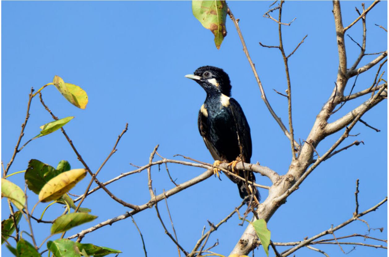
Sulawesi Myna