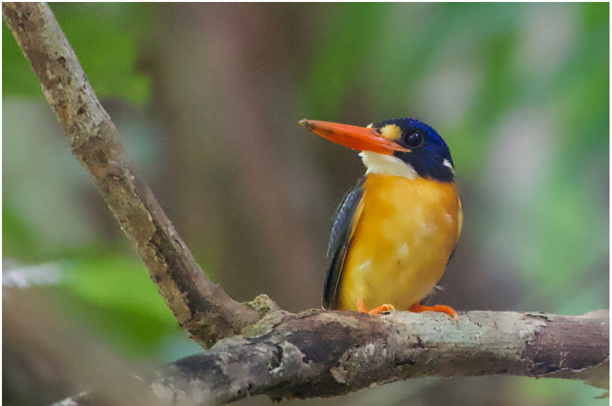
Moluccan Dwarf Kingfisher