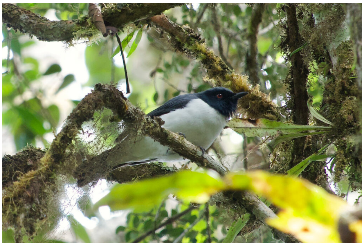
Pygmy Cuckooshrike