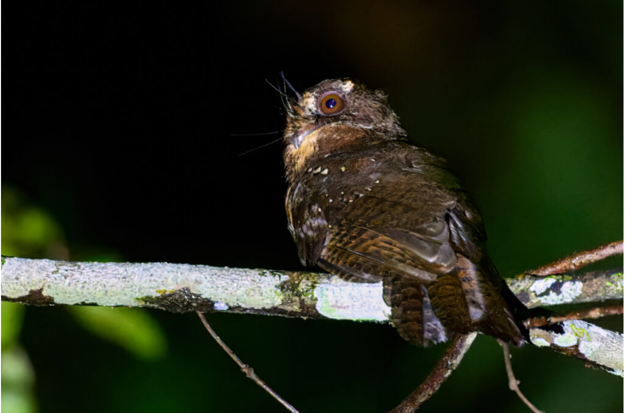
Moluccan Owlet-nightjar