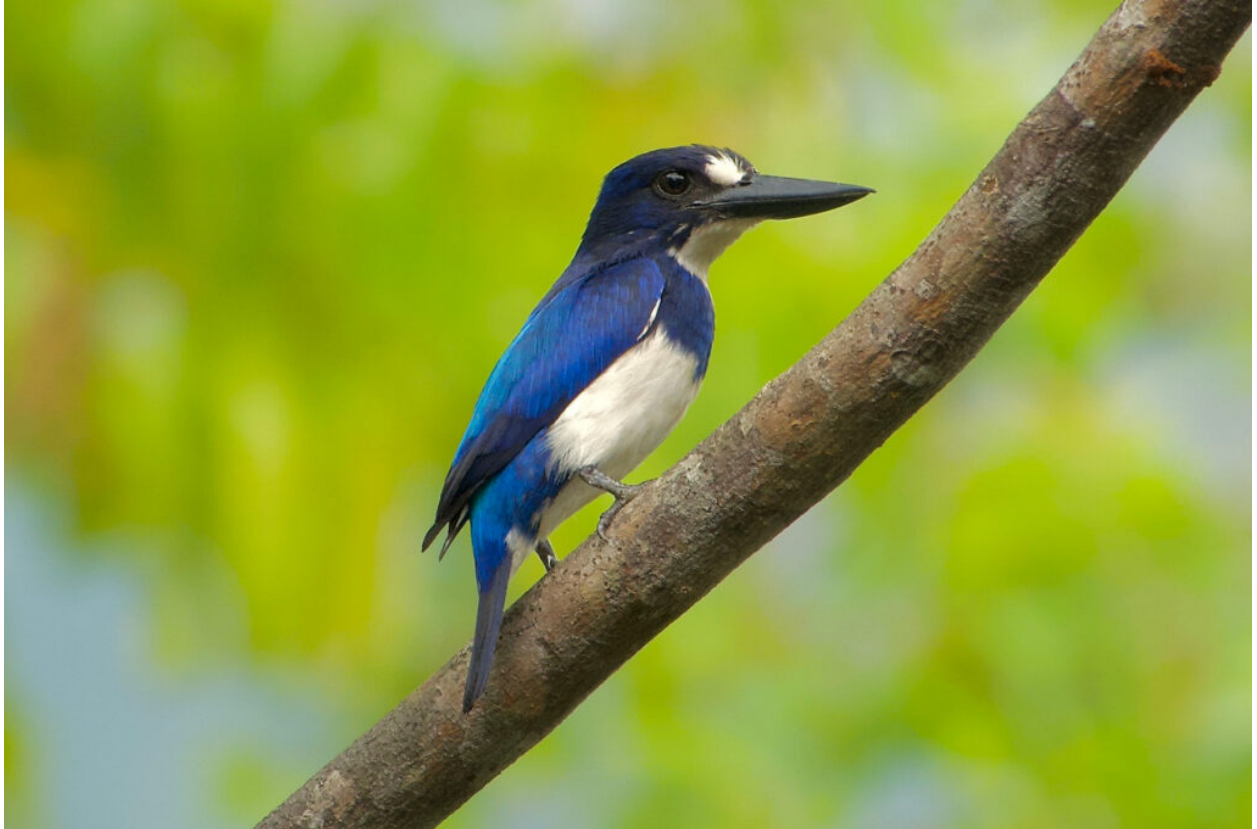
Blue-and-white Kingfisher