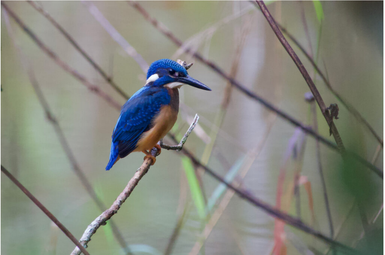
Cobalt-eared (Common) Kingfisher