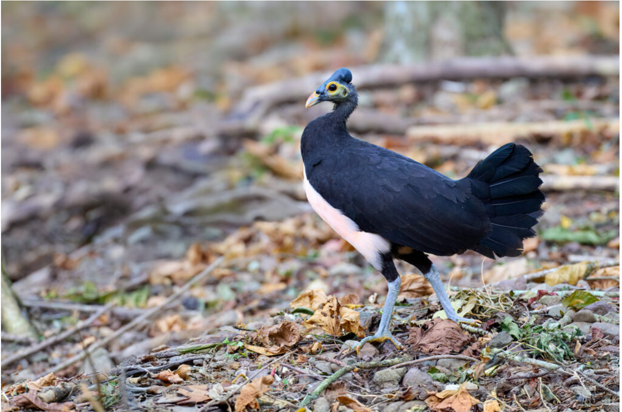
Maleo