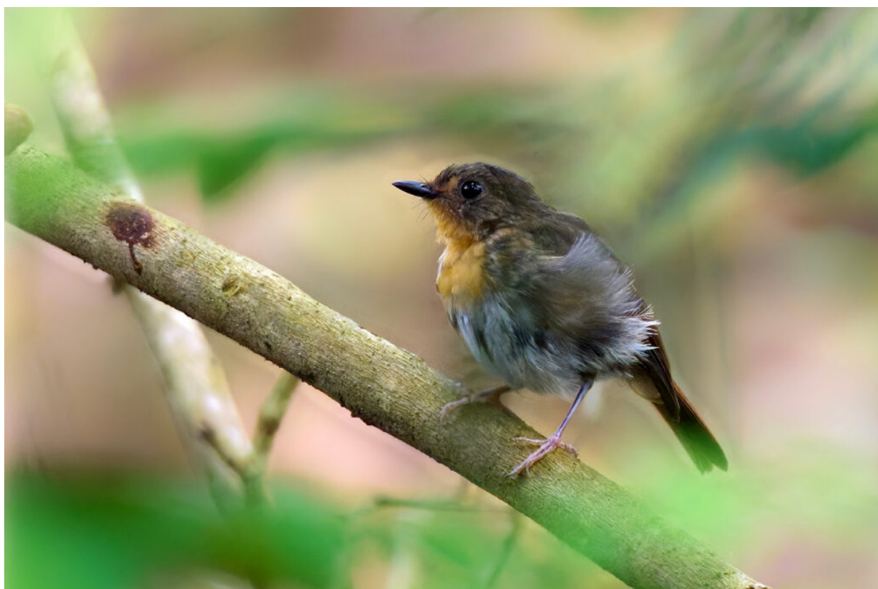
Lompobattang Flycatcher