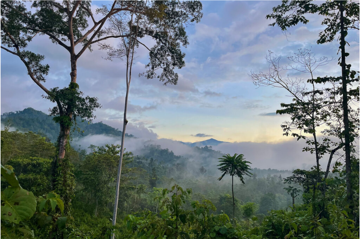
Dusk on Halmahera