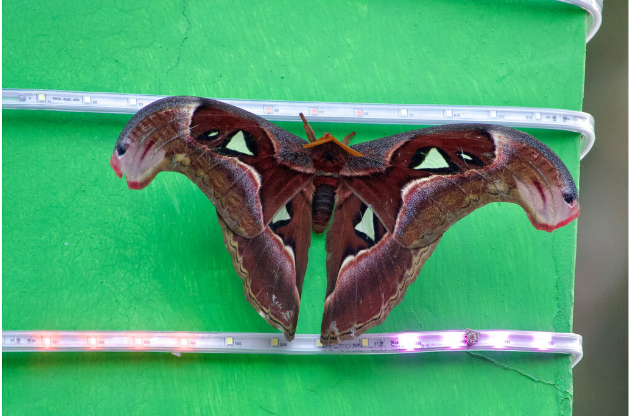
Sulawesi Atlas Moth