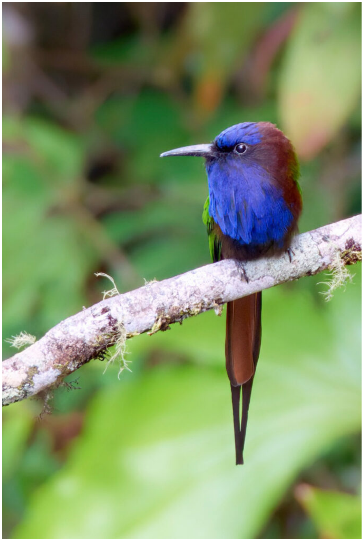
Purple-bearded Bee-eater