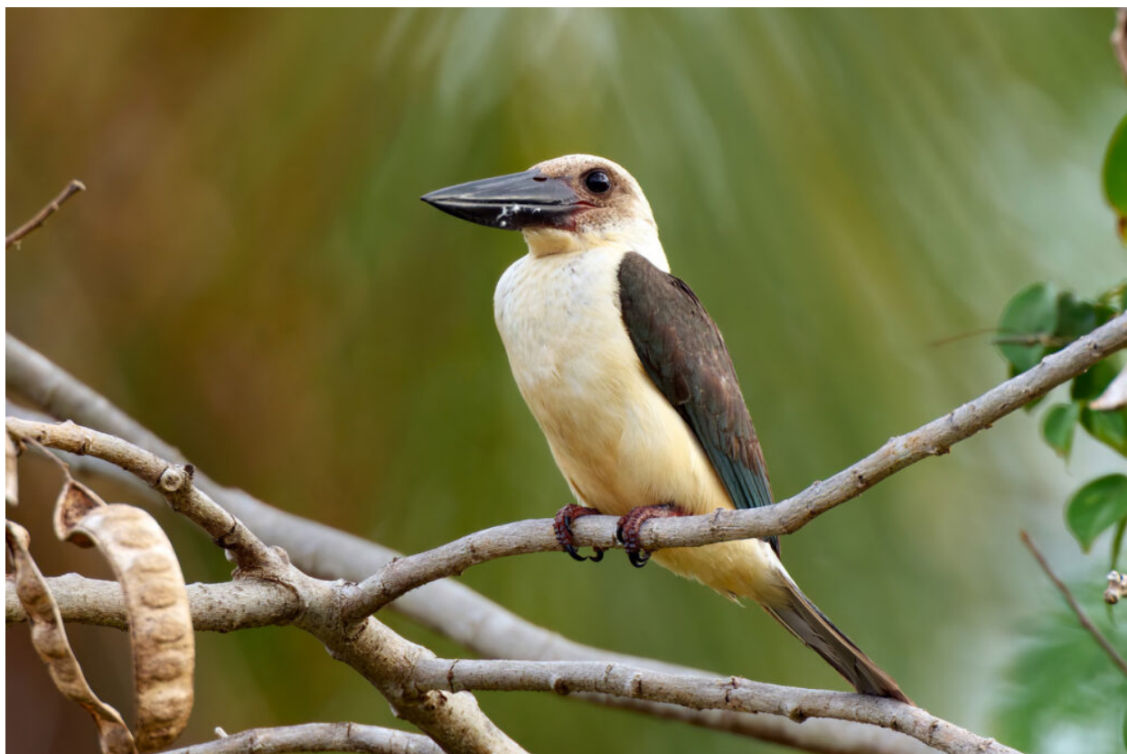
Great-billed Kingfisher