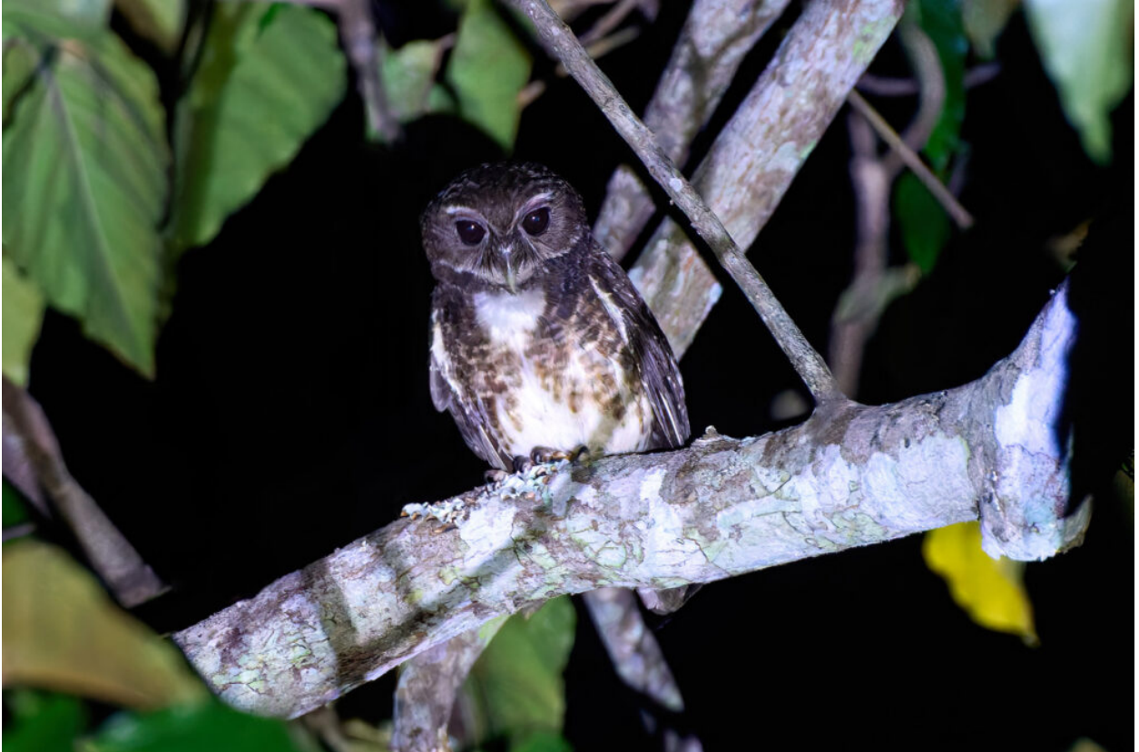
Speckled Boobook