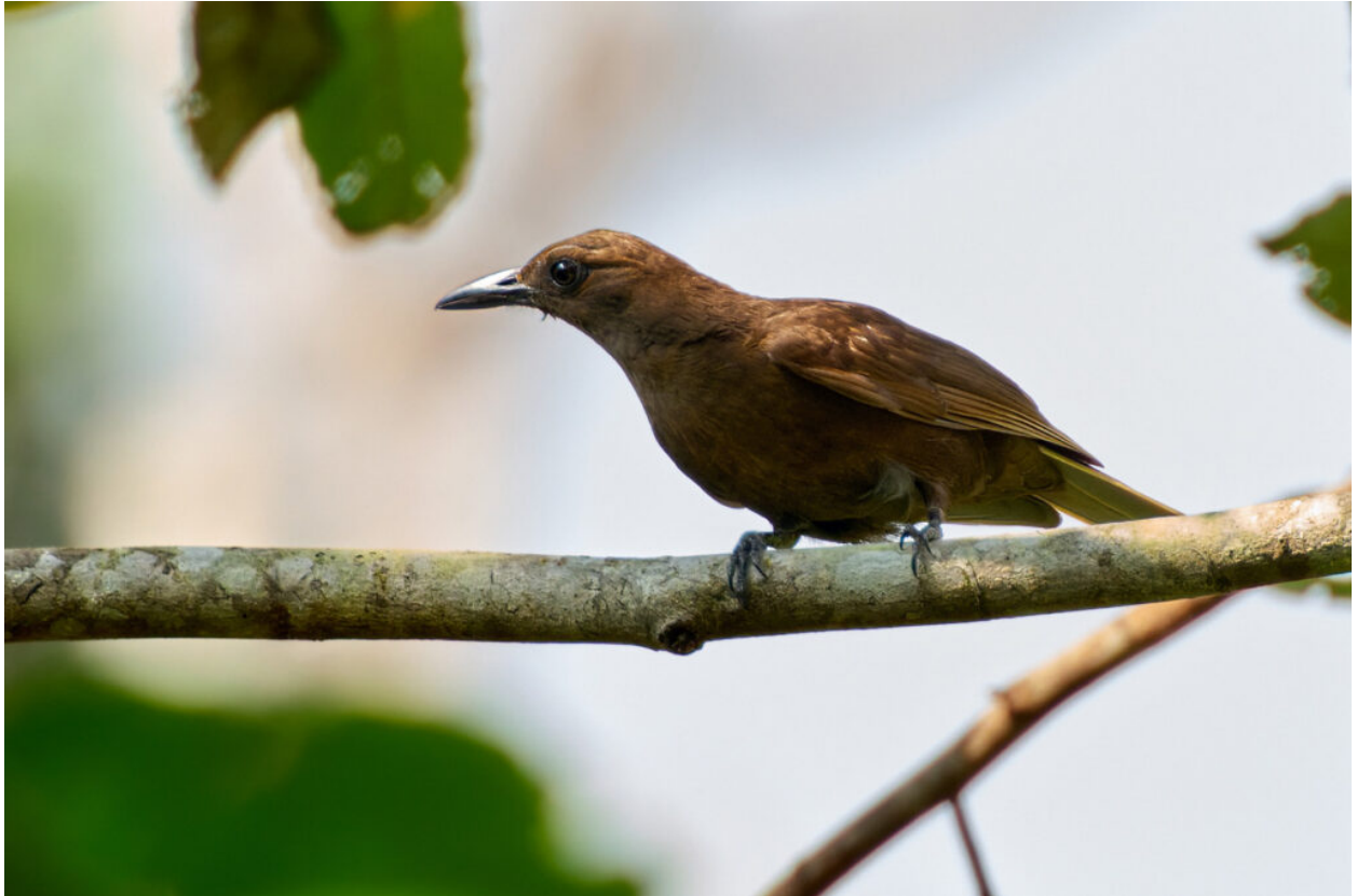
Dusky Brown Oriole