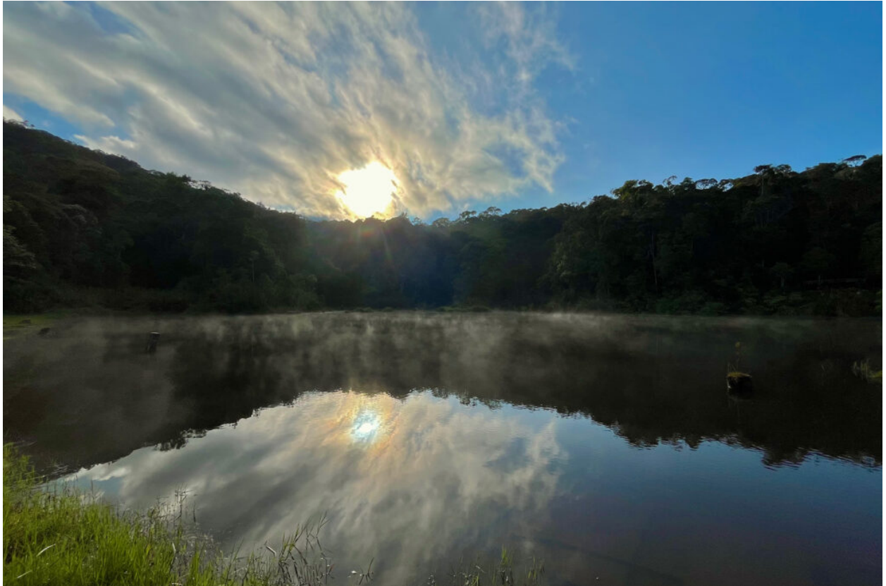
Lake Taming