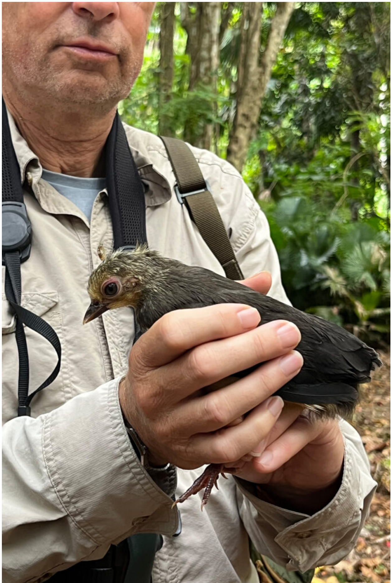
juvenile Maleo