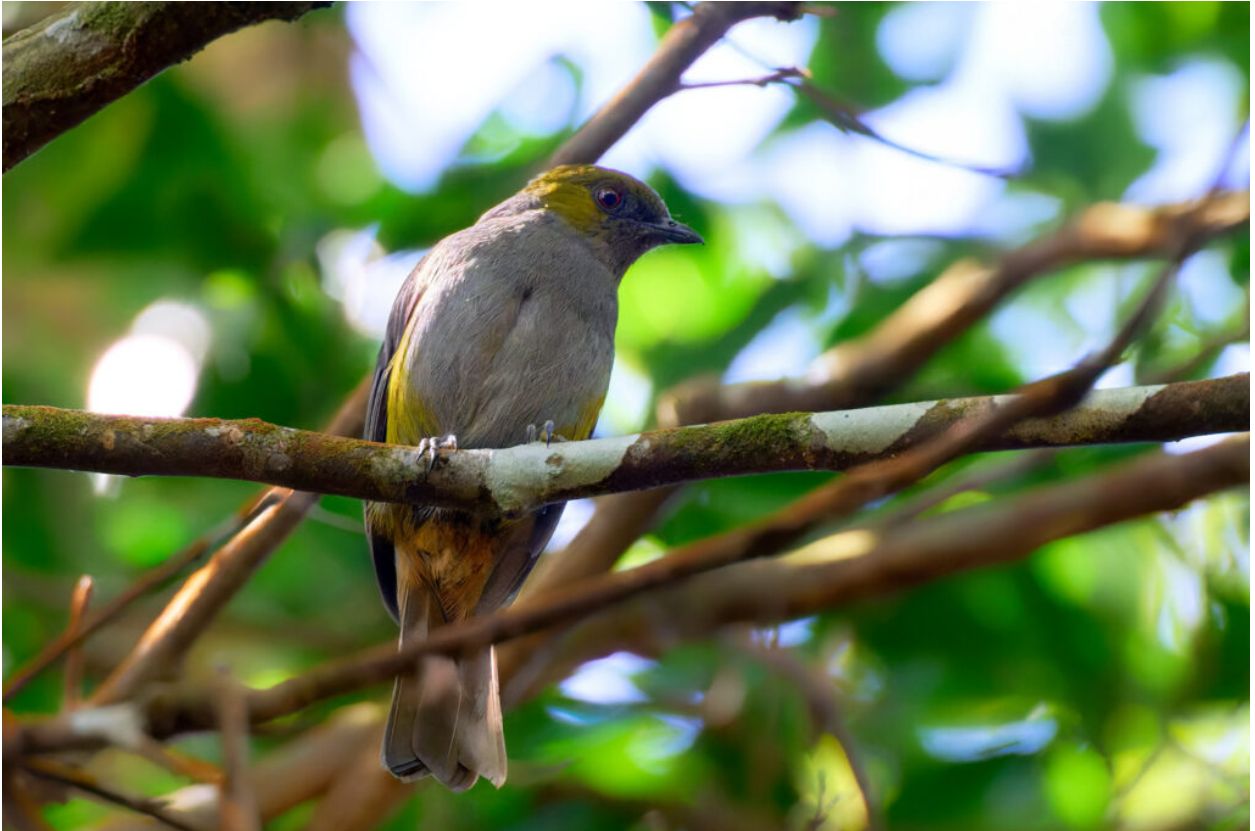
Southern Hylocitrea