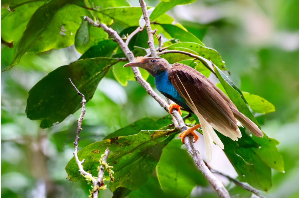
Standardwing