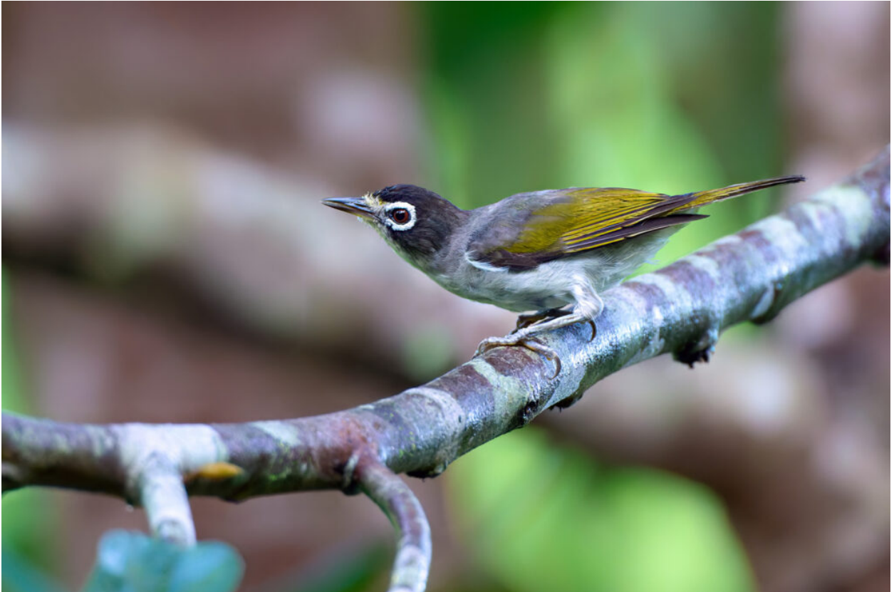
Morotai White-eye