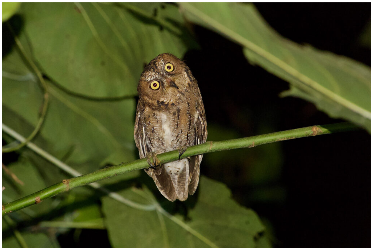
Sulawesi Scops Owl