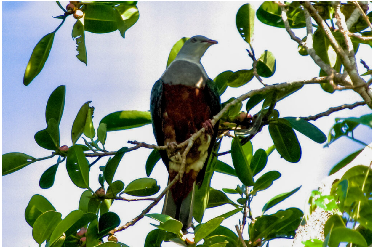
Spotted Imperial Pigeon

Chalky Percher Diplacodes trivialis Bohol.