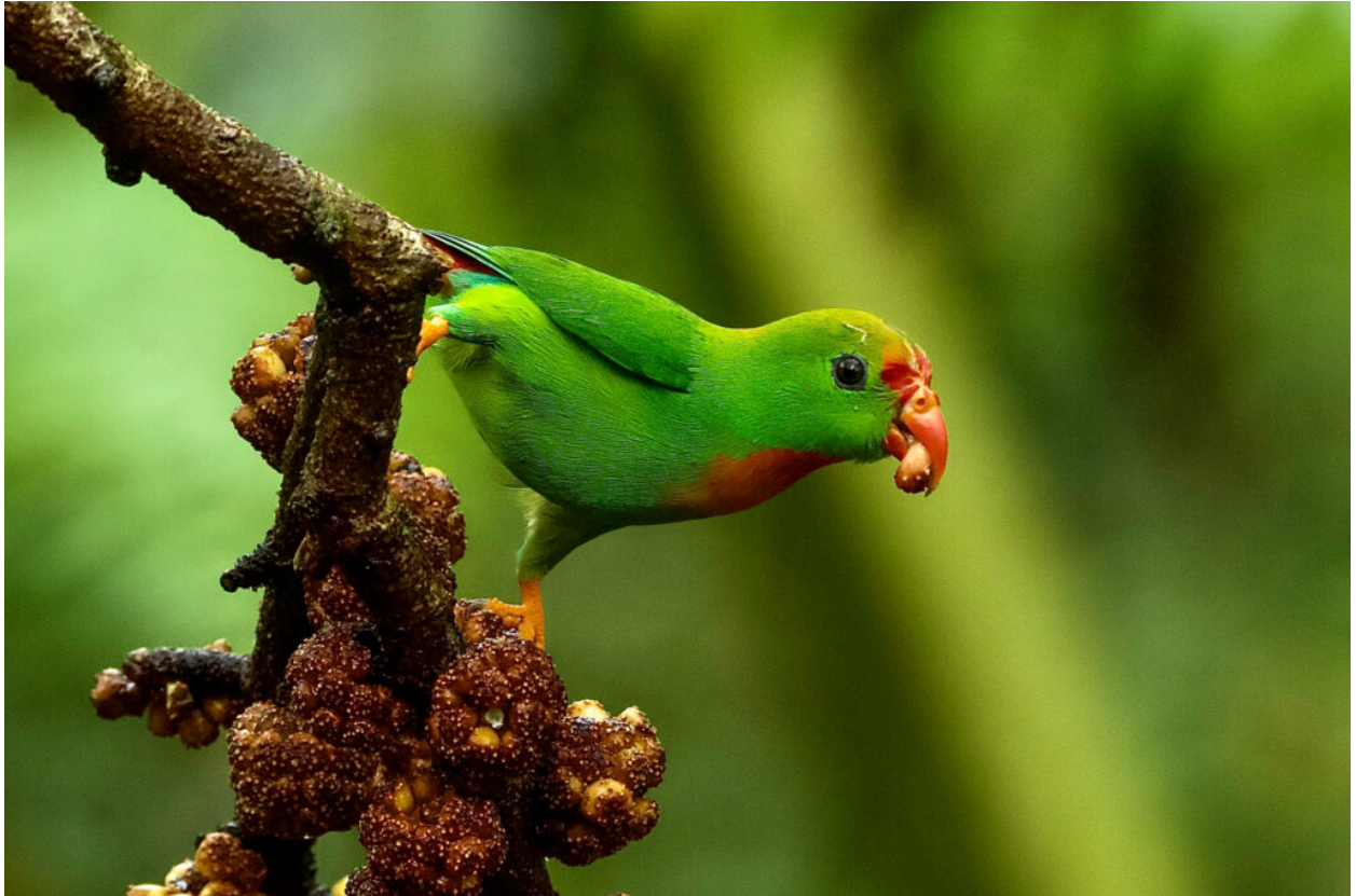
Philippine Hanging Parrot