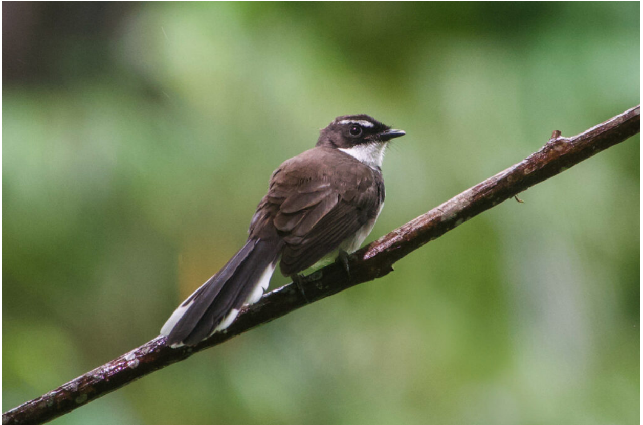
Philippine Pied Fantail