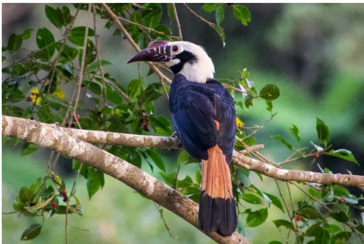
Visayan Hornbill