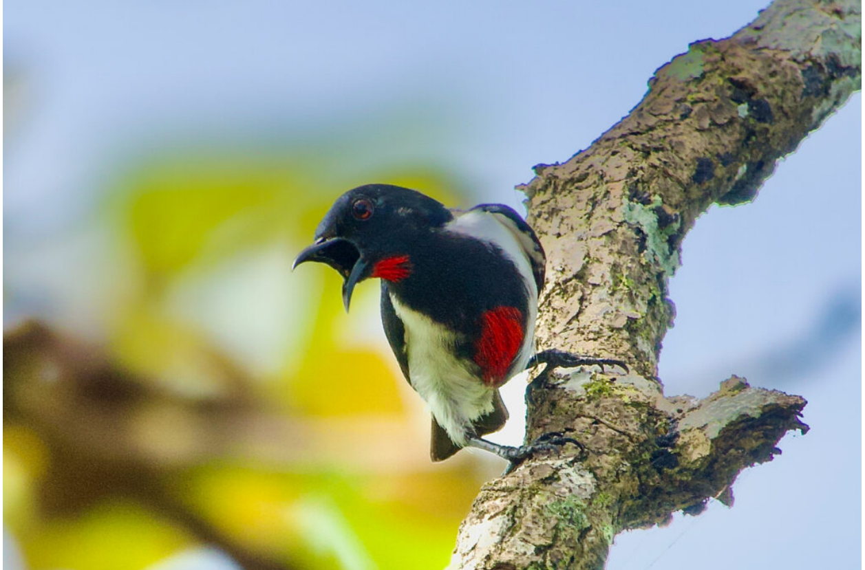
Scarlet-collared Flowerpecker