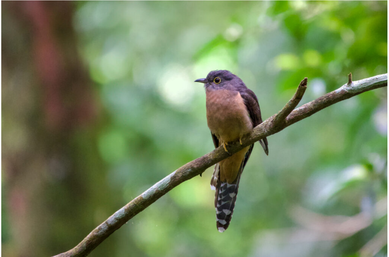
Sunda Brush Cuckoo