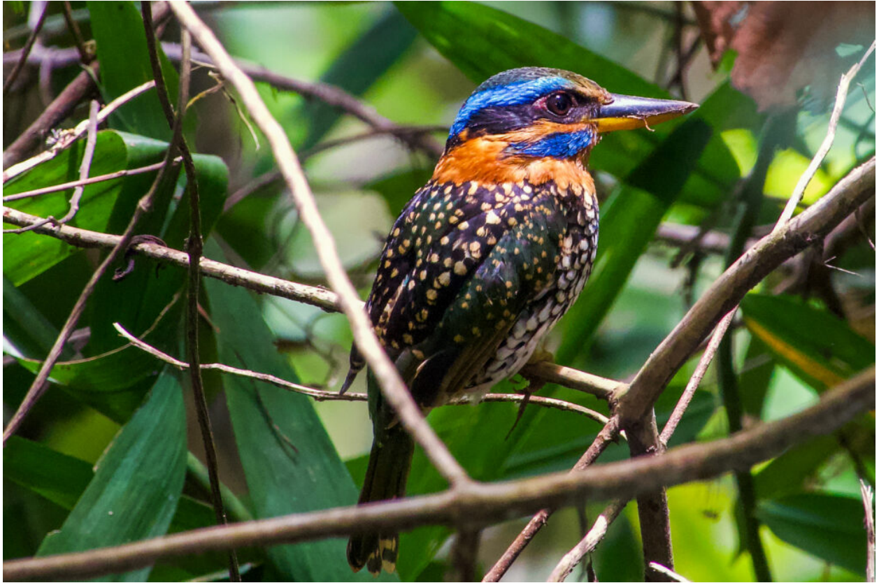
Negros Spotted Kingfisher