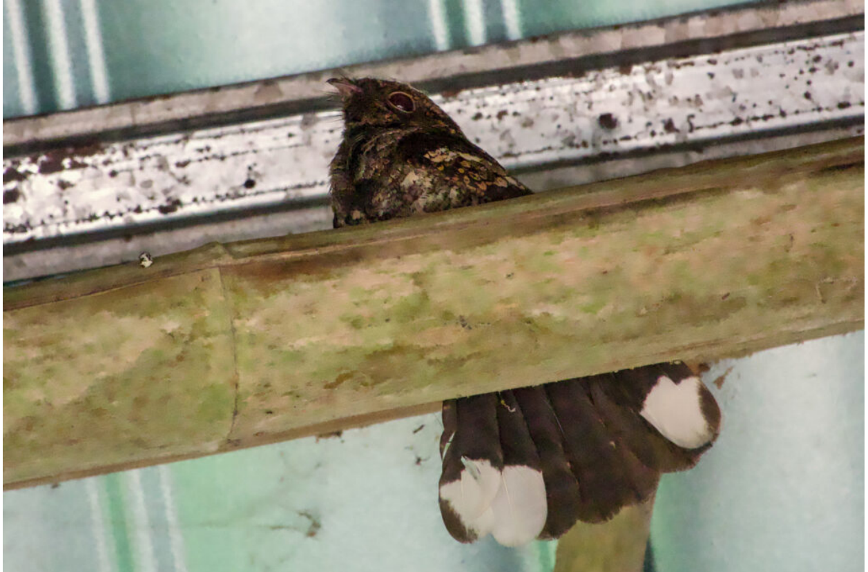
Philippine Nightjar