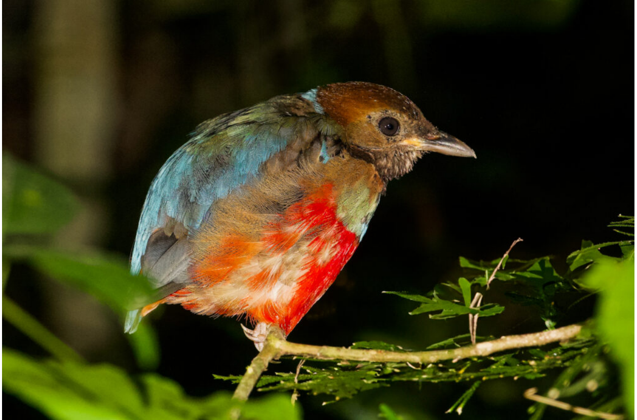
Philippine Pitta