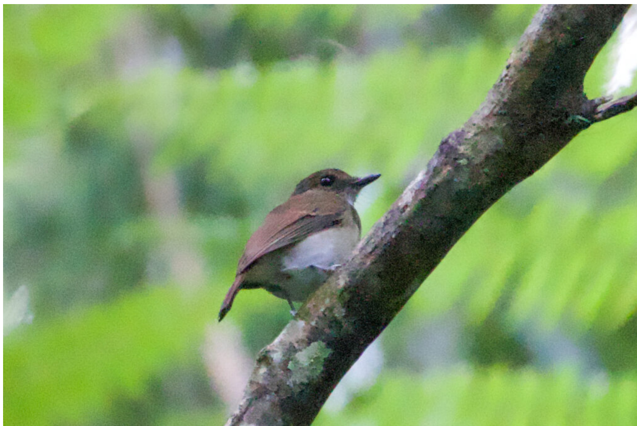
White-throated Jungle Flycatcher