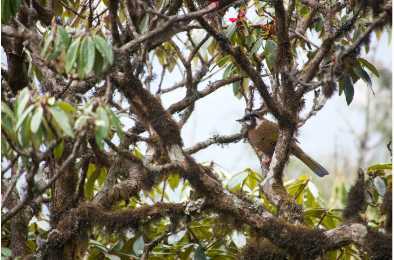
Black-faced Laughingthrush