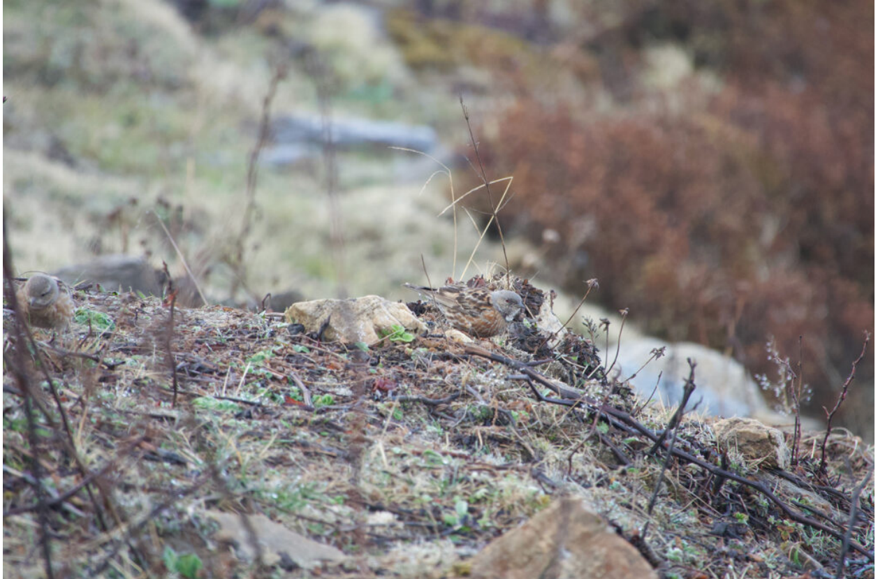
Altai Accentor (image by Craig Robson)