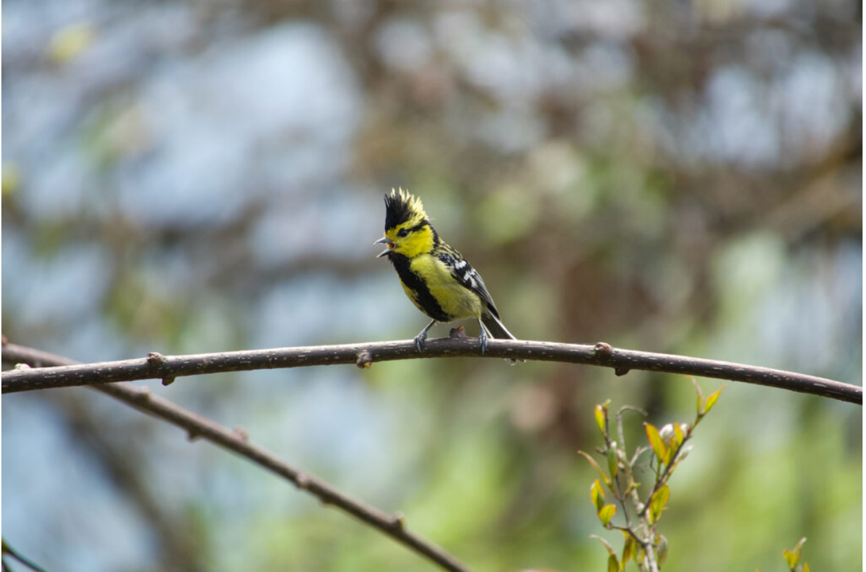
Yellow-cheeked Tit