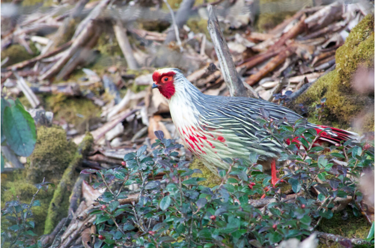
Blood Pheasant