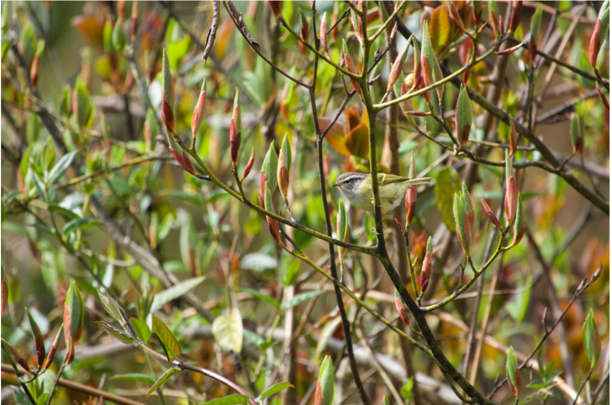
Ashy-throated Warbler