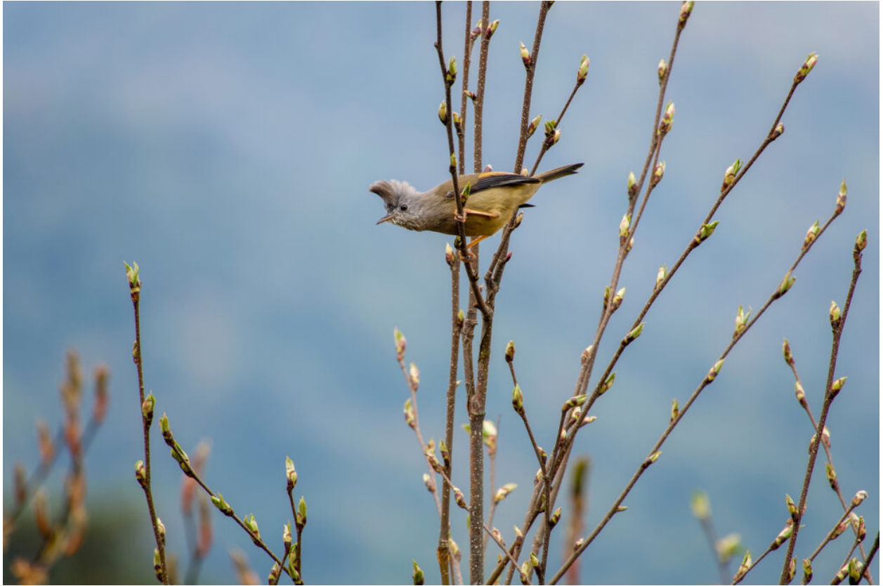
Stripe-throated Yuhina