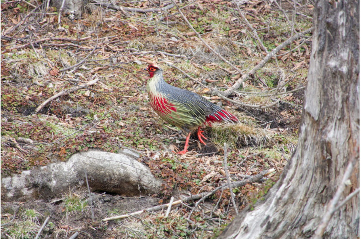
Blood Pheasant