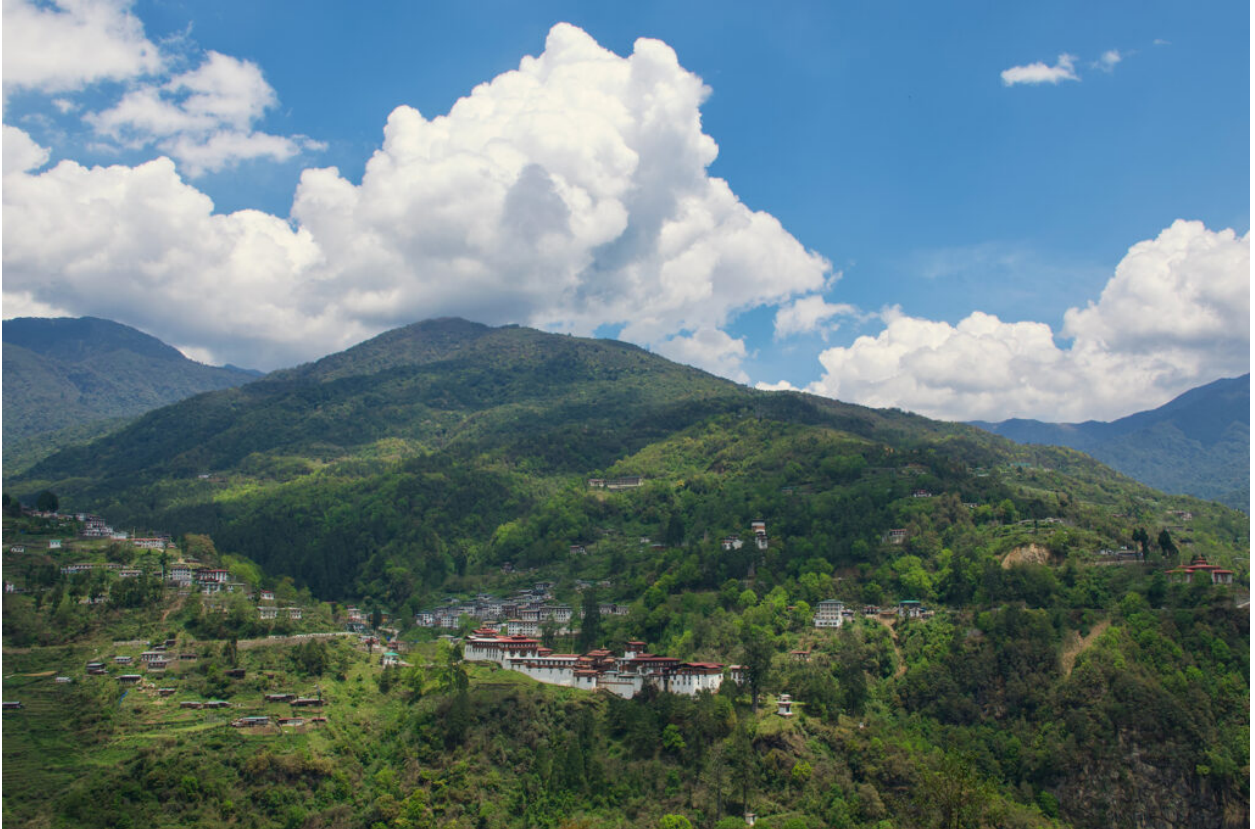
Trongsa Dzong