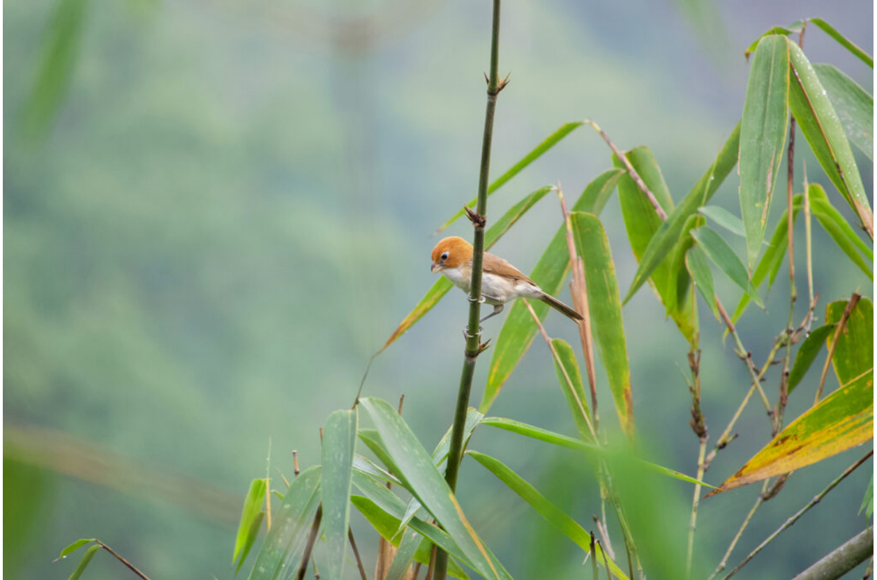
White-breasted Parrotbill