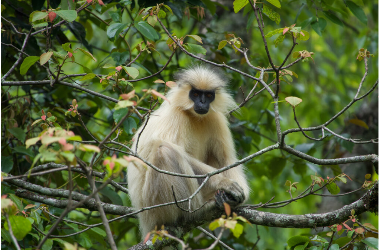
Gee's Golden Langur