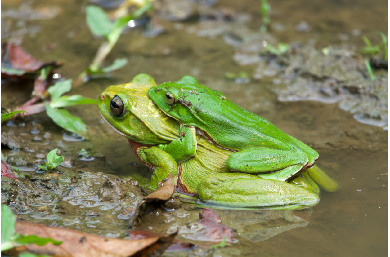
White-lipped Treefrog