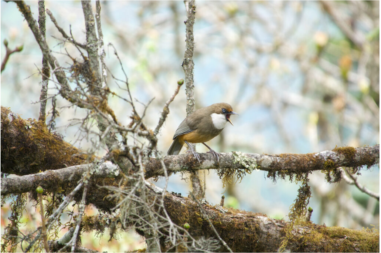
White-throated Laughingthrush