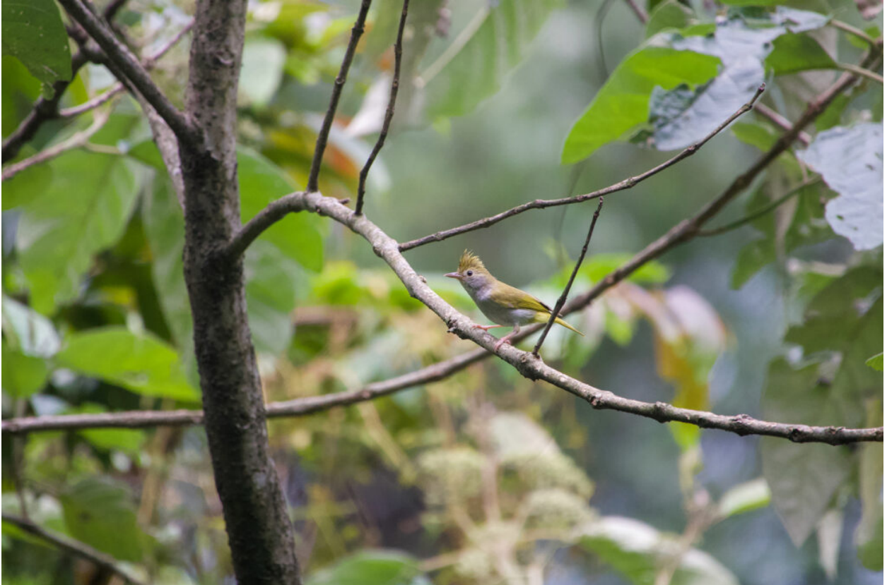
White-bellied Erpornis