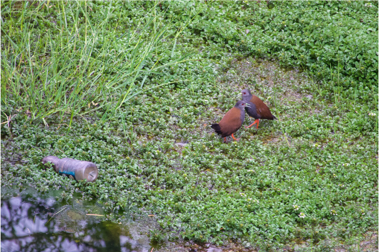
Black-tailed Crakes