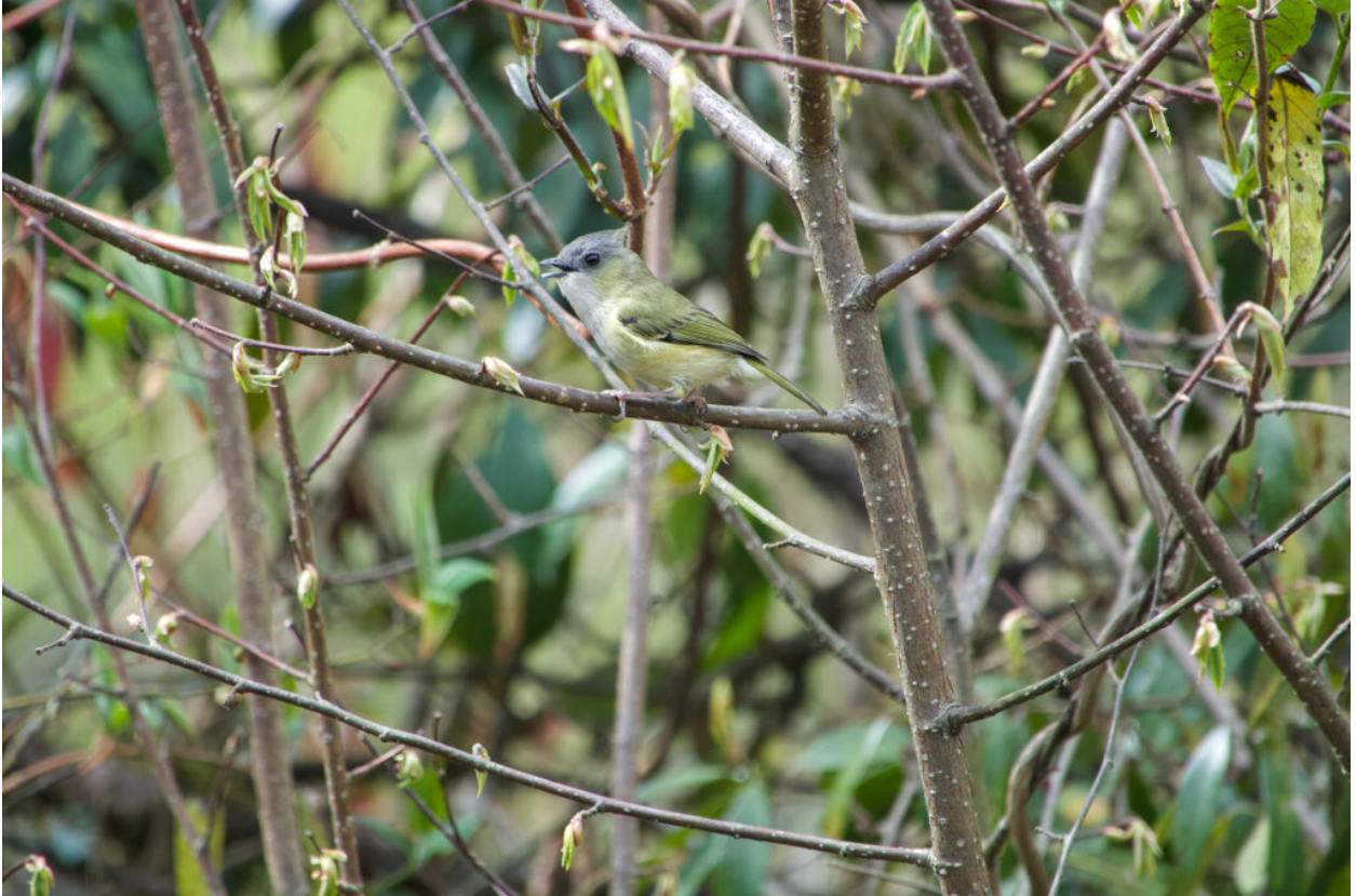
Green Shrike-Babbler