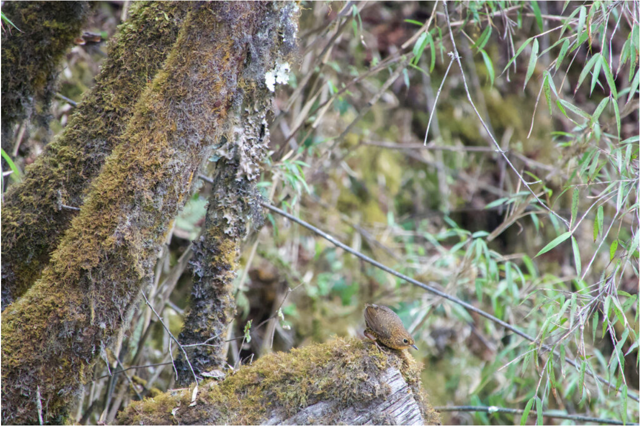
Scaly-breasted Cupwing