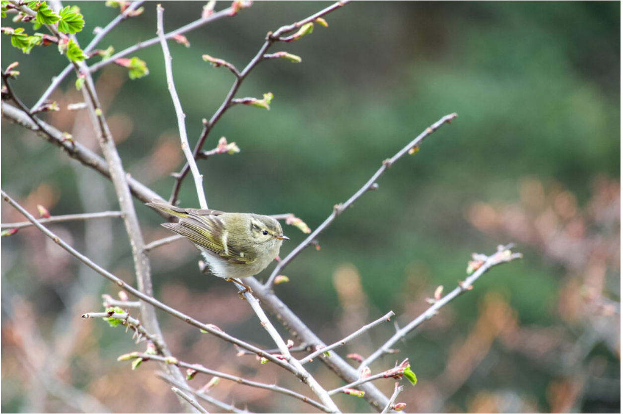
Lemon-rumped Warbler