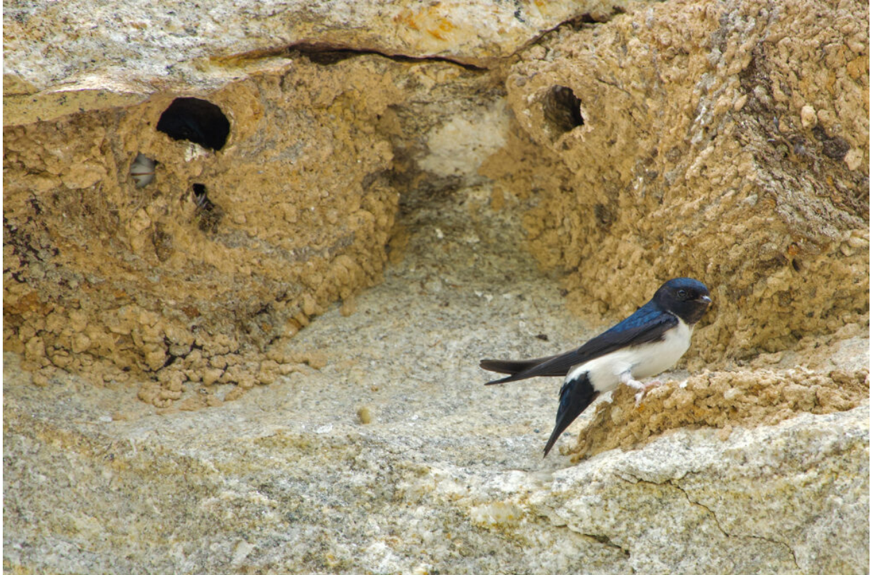
Nepal House Martin