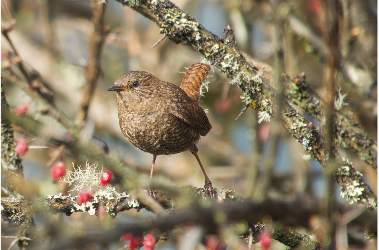
Eurasian Wren