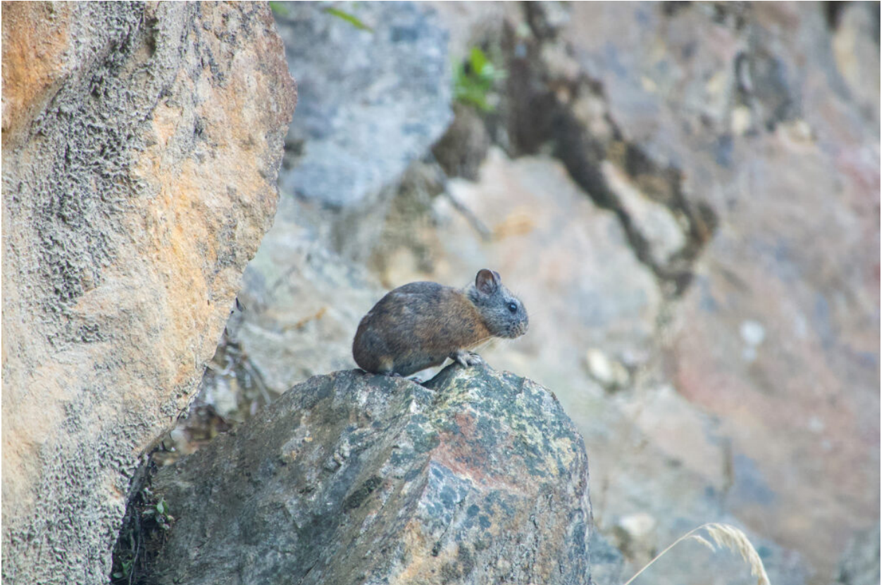
Moupin Pika