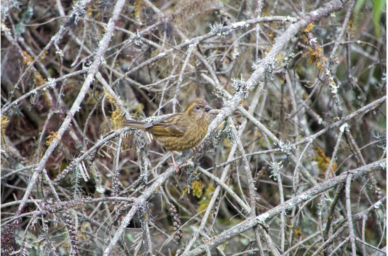
Dark-rumped Rosefinch