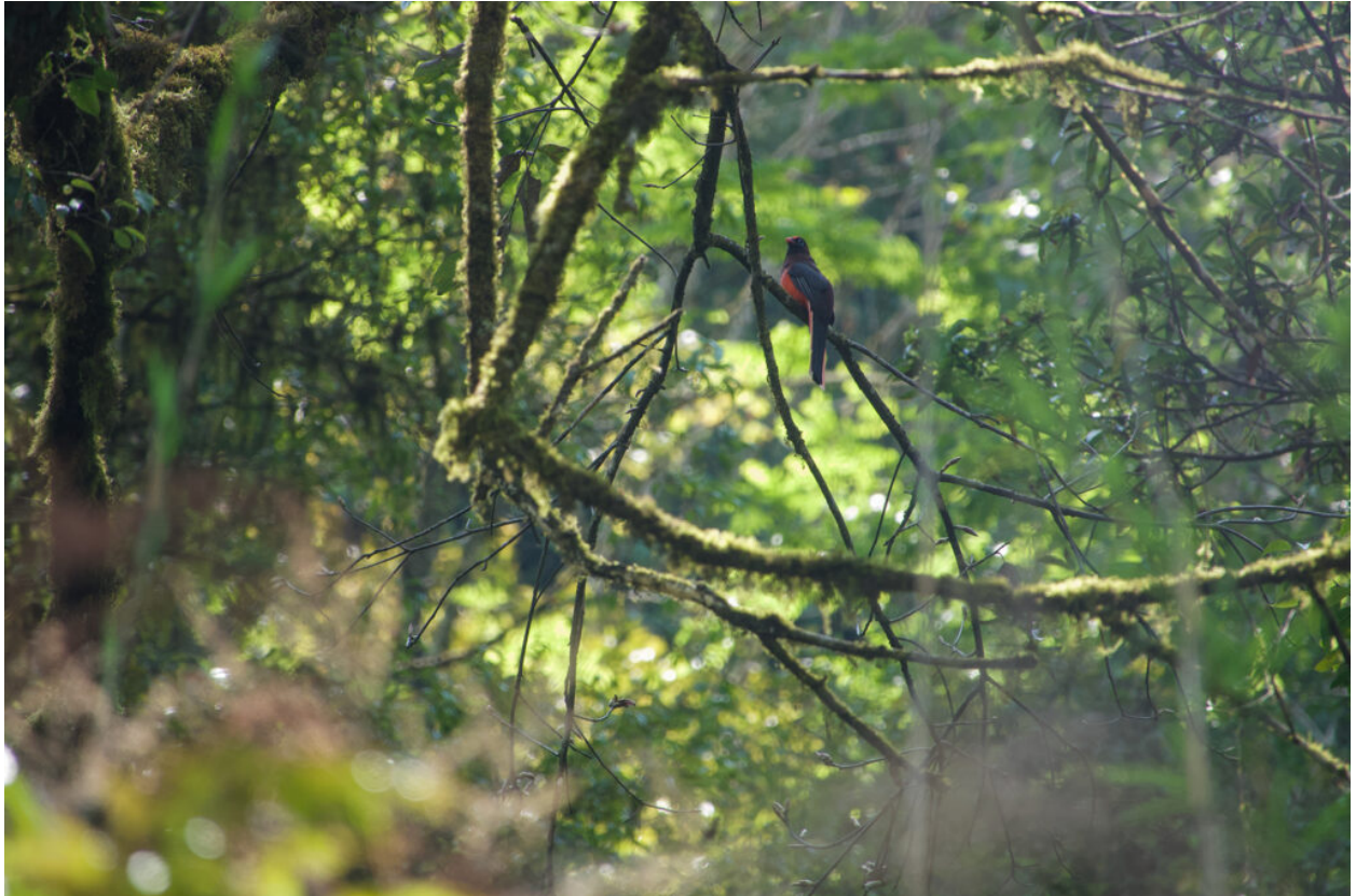
Ward's Trogon