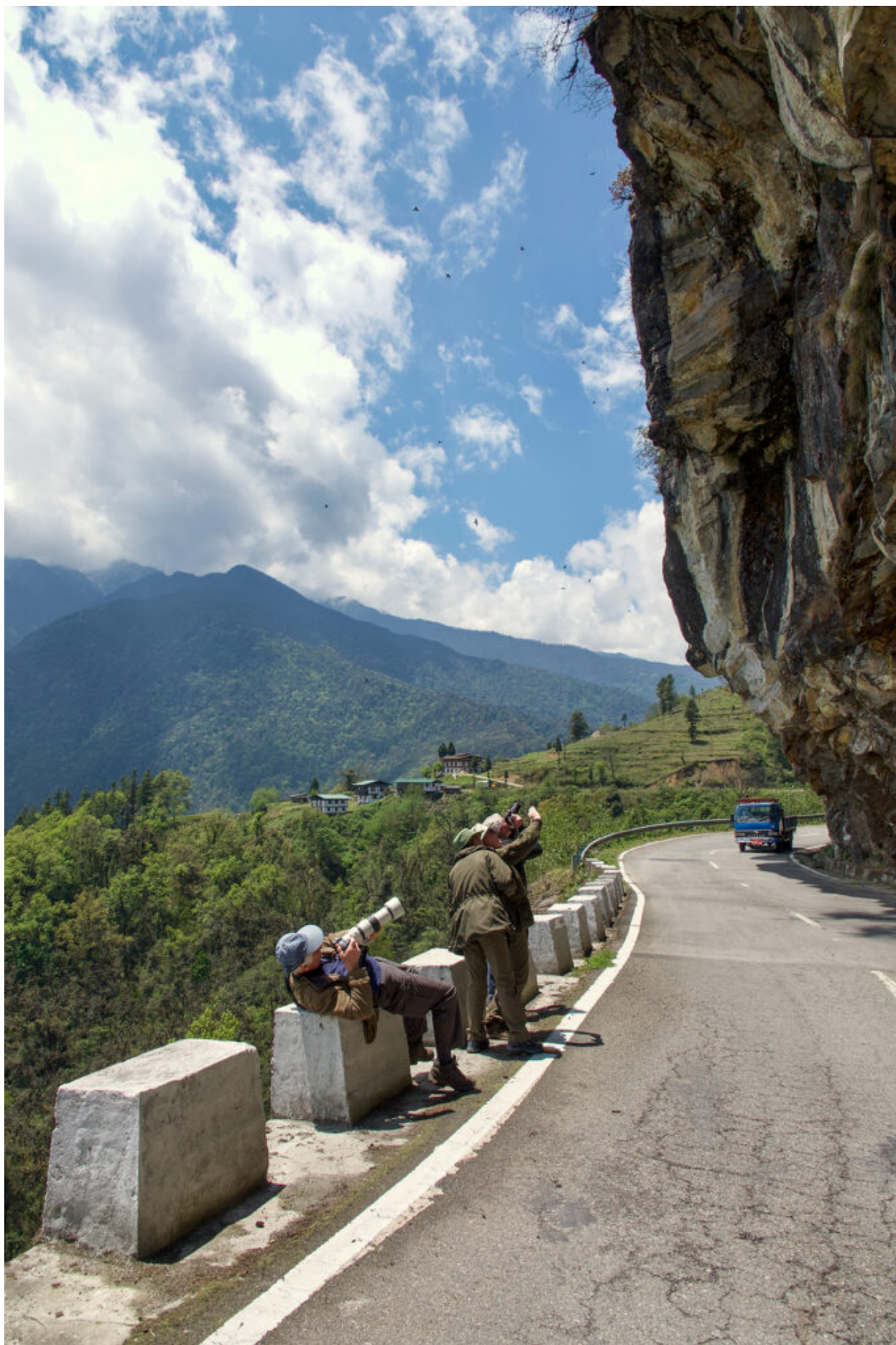
Watching Nepal House Martins