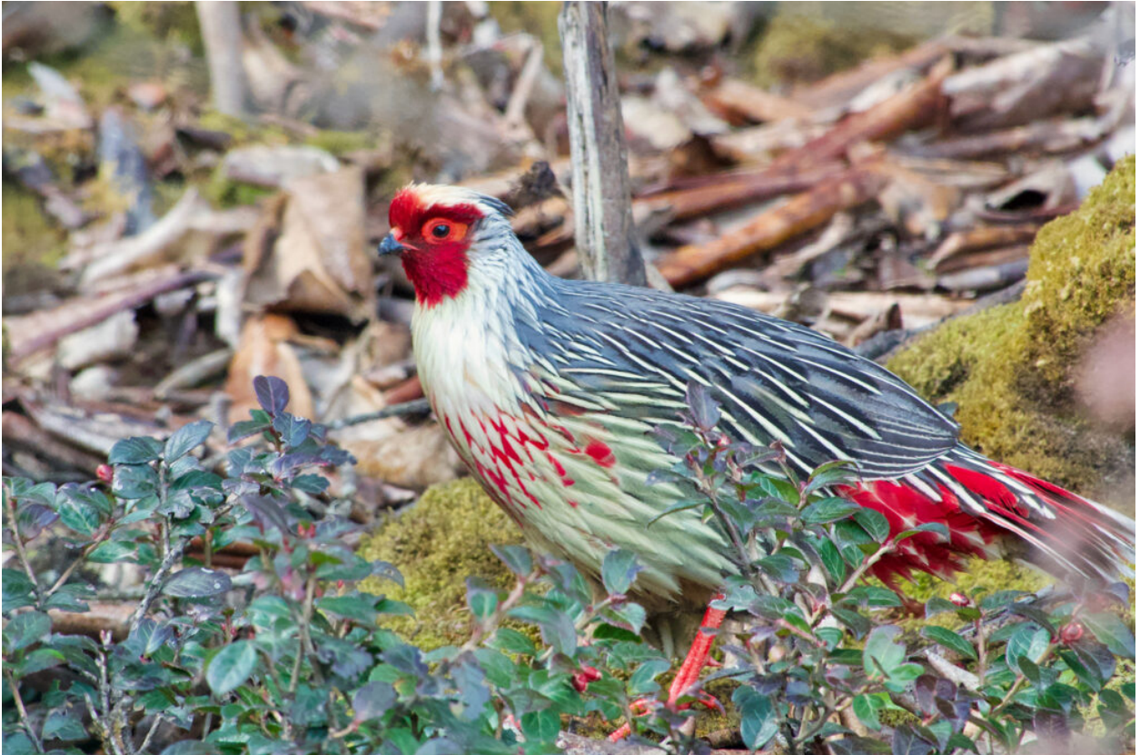
Blood Pheasant