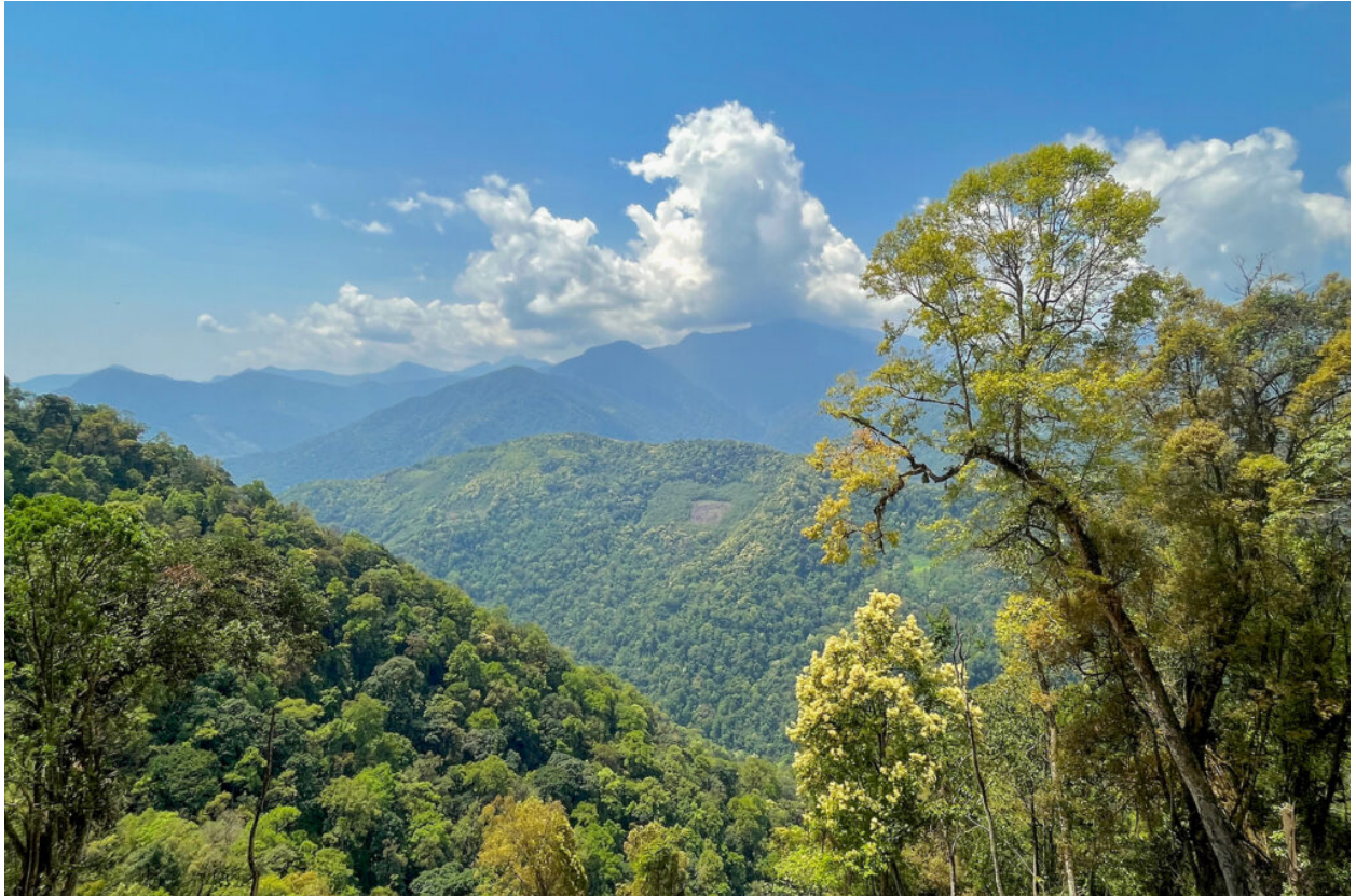
Lingmethang Road