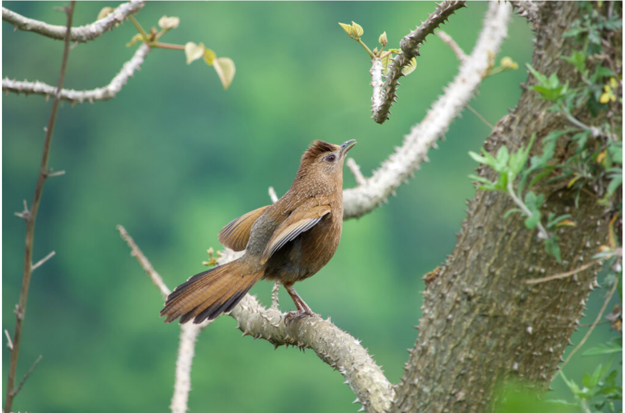
Bhutan Laughingthrush