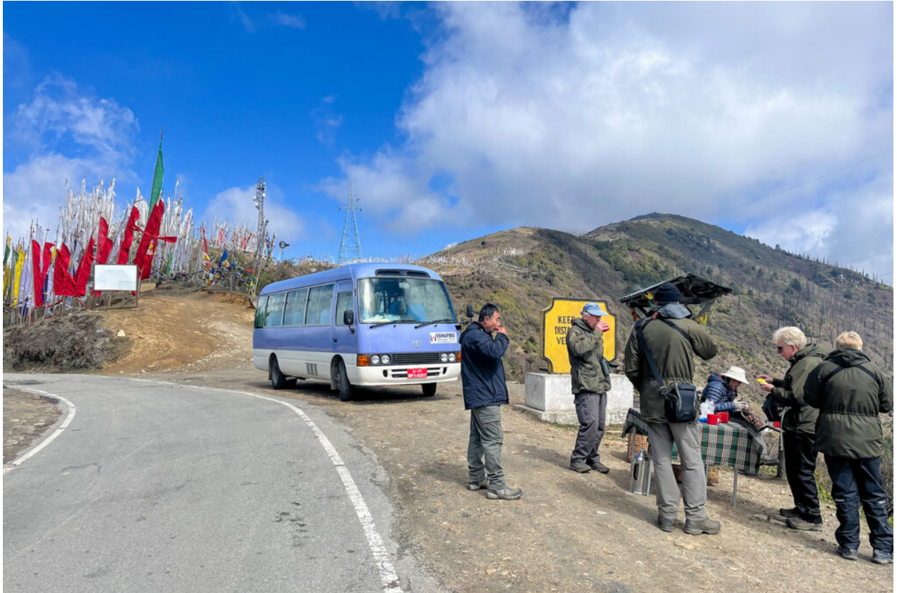
Tea break at Chele La