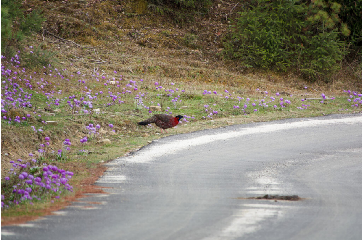
Satyr Tragopan