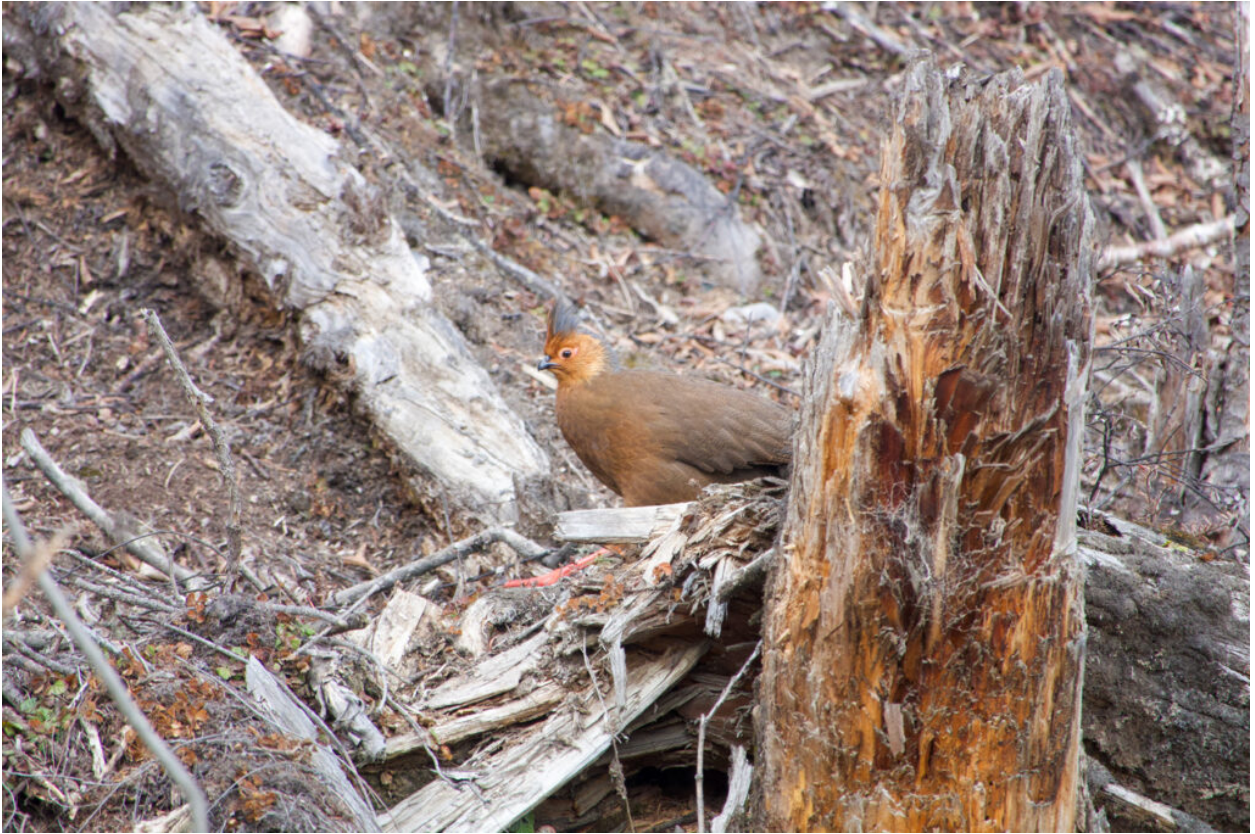
female Blood Pheasant