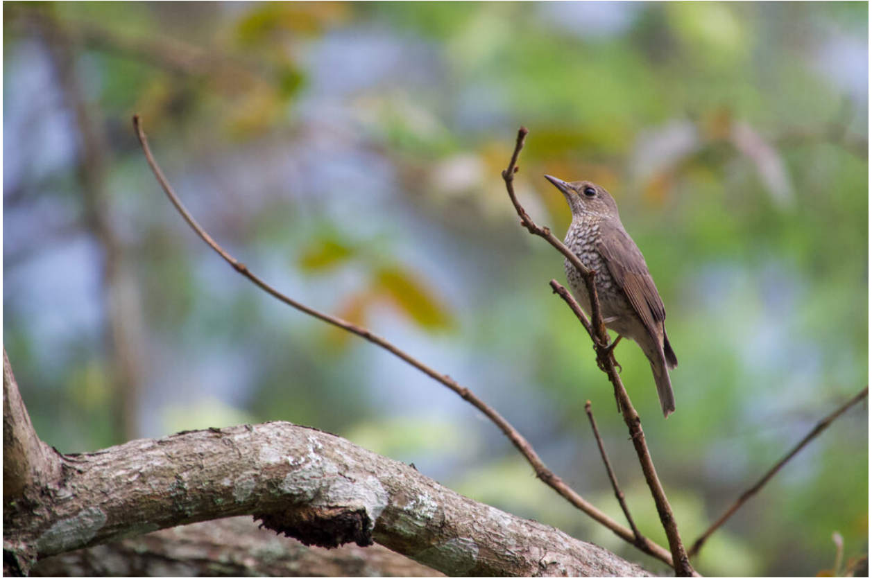
Blue-capped Rock Thrush