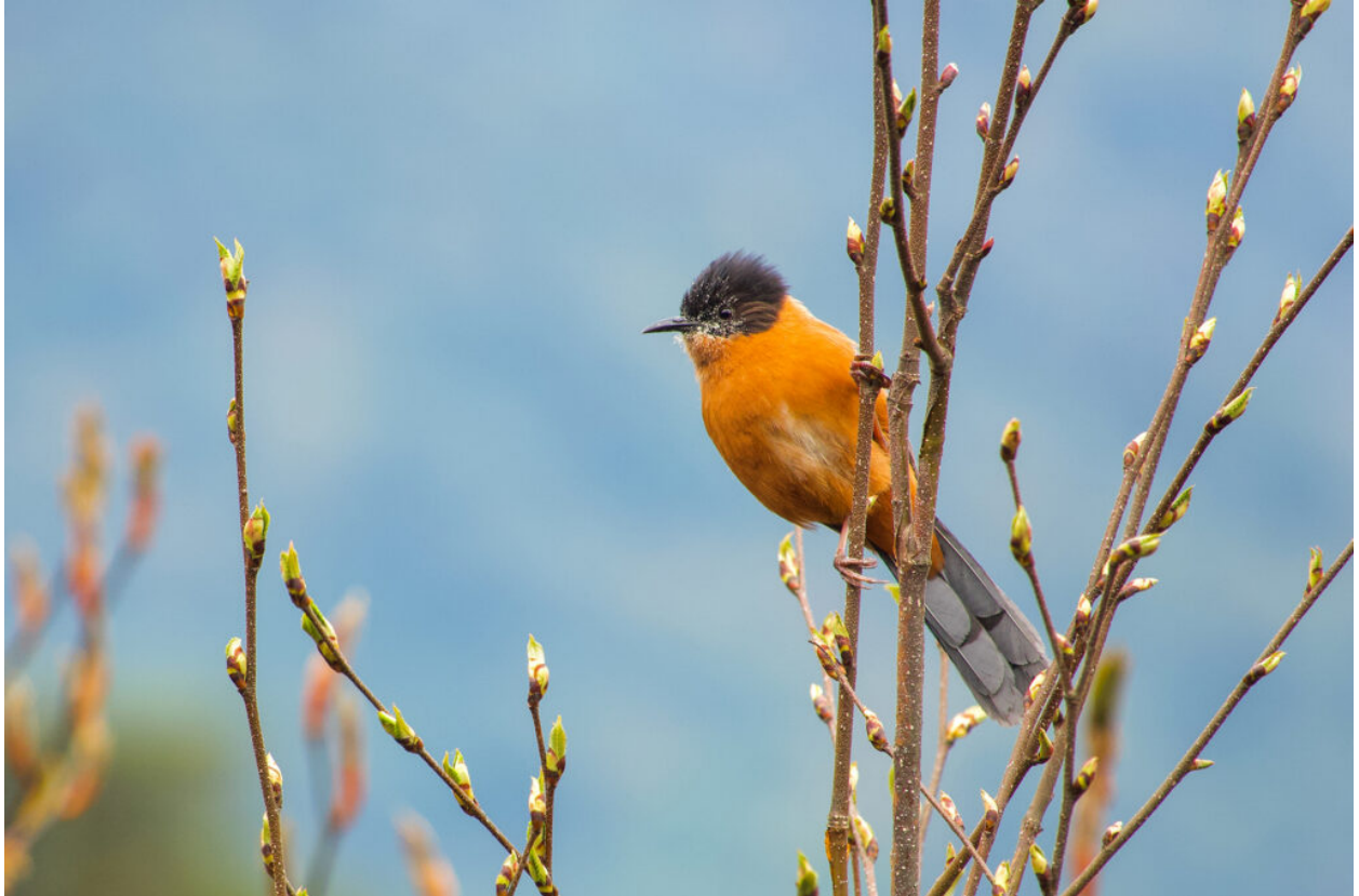
Rufous Sibia