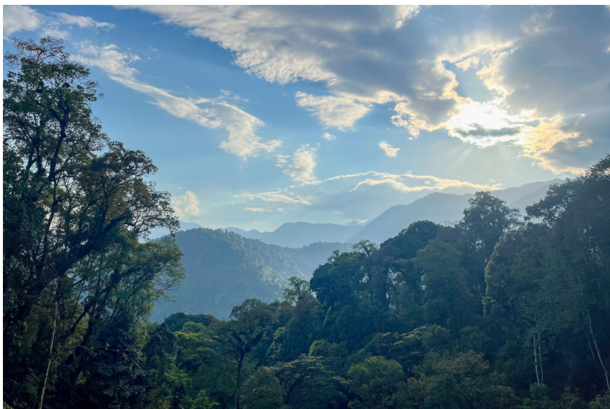
Lingmethang Road (image by Craig Robson)