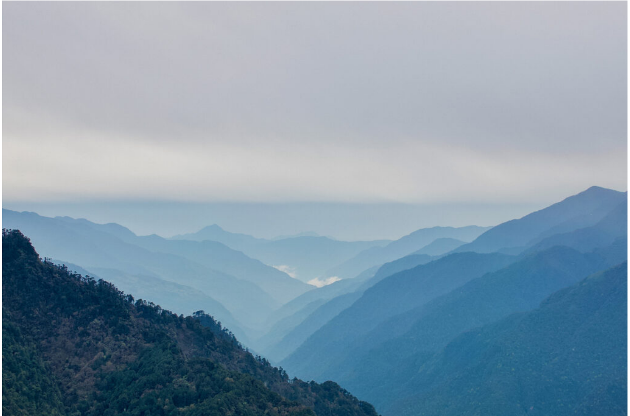
On the way to Lingmethang Road