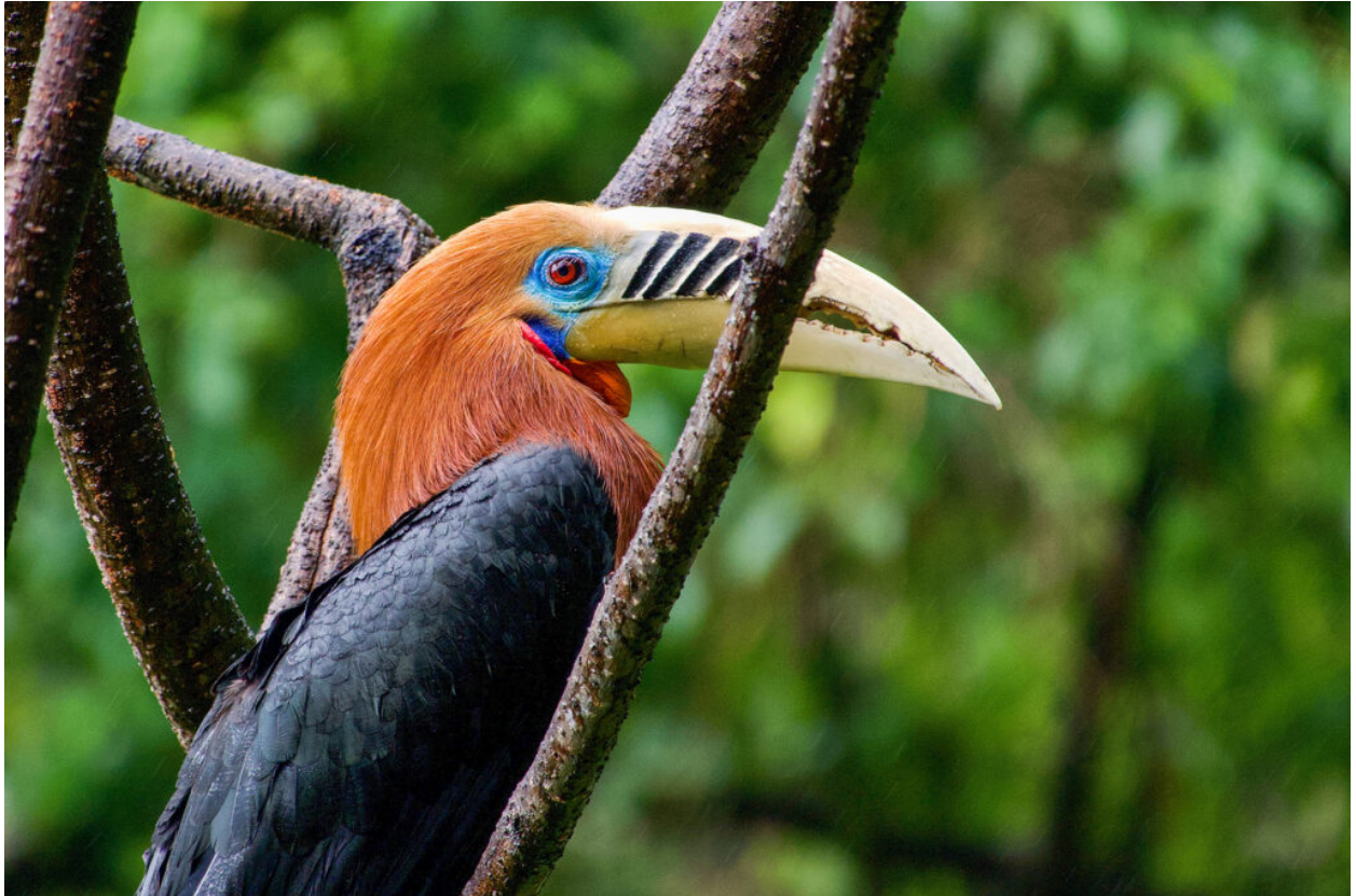
Rufous-necked Hornbill