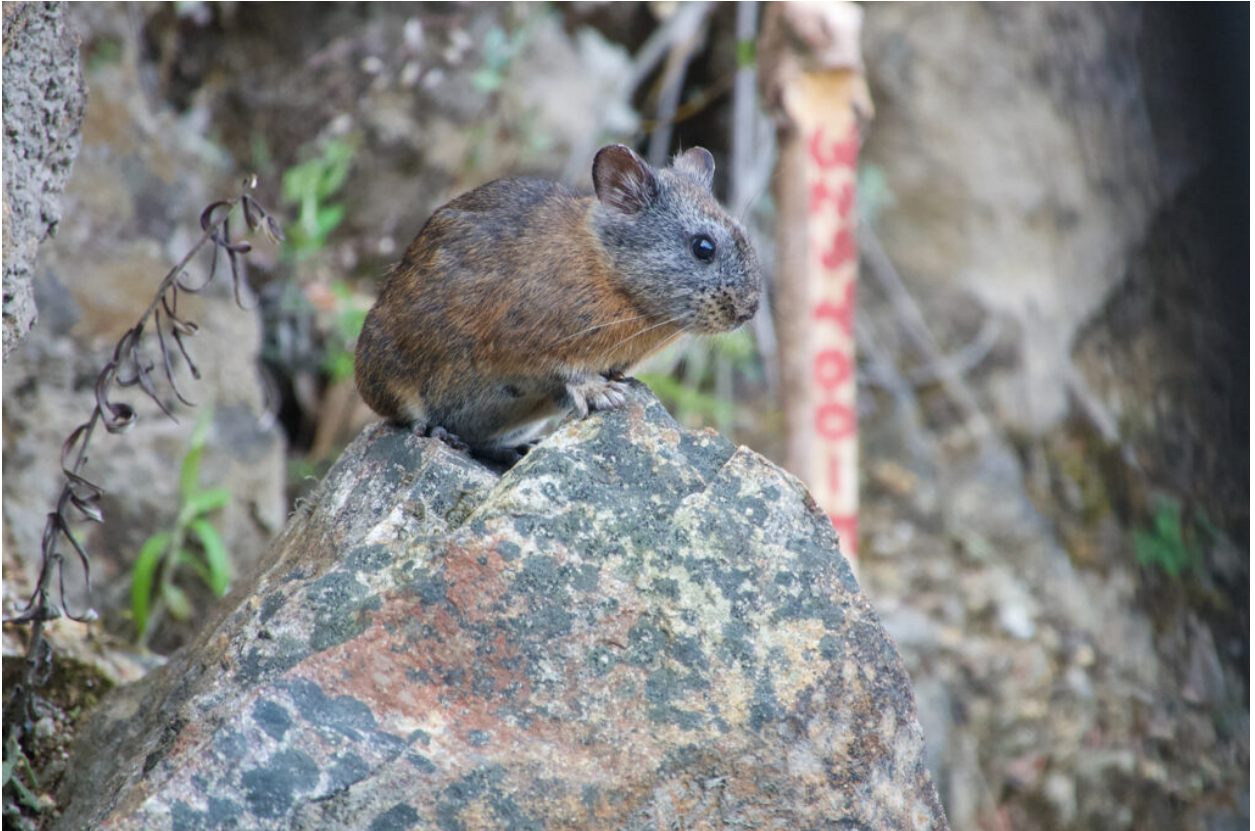
Moupin Pika