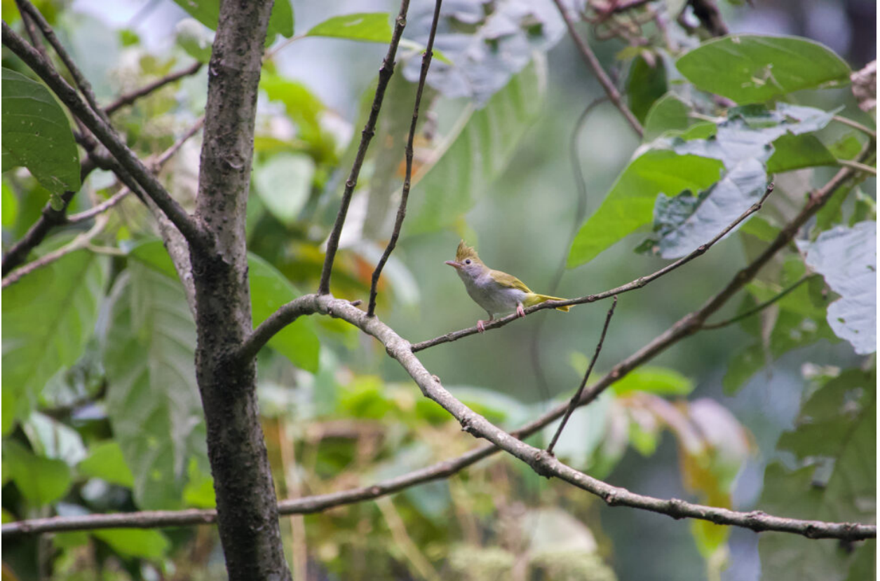
White-bellied Erpornis