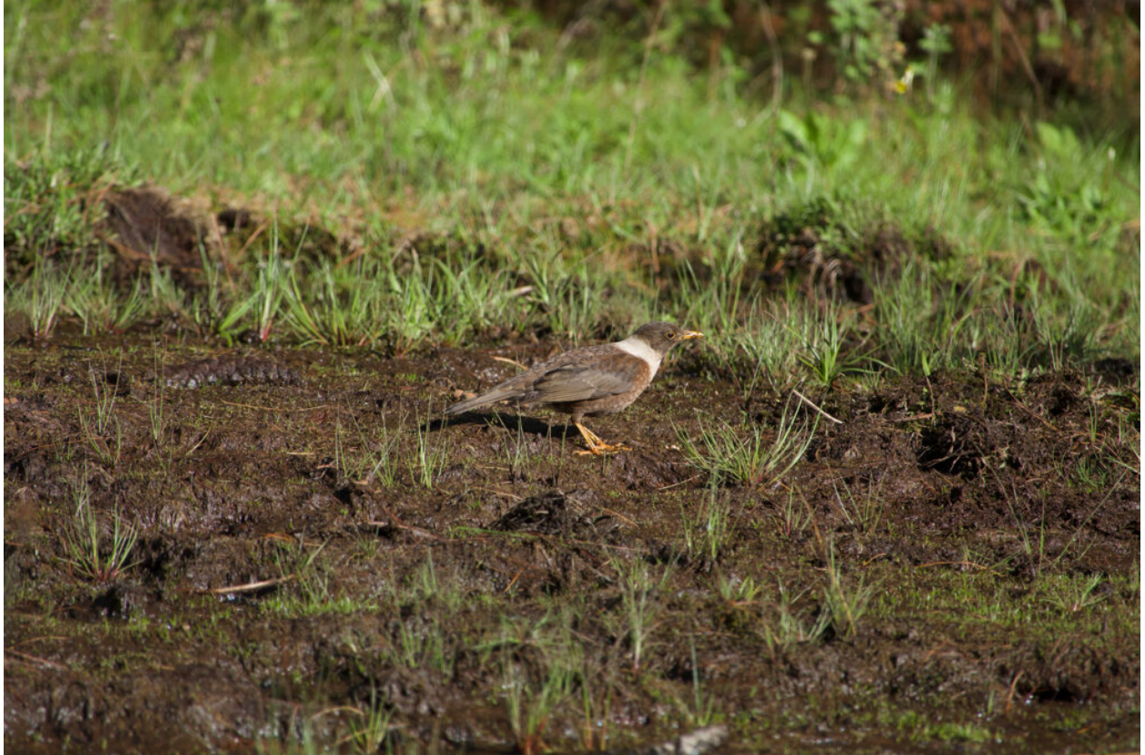
White-collared Blackbird female