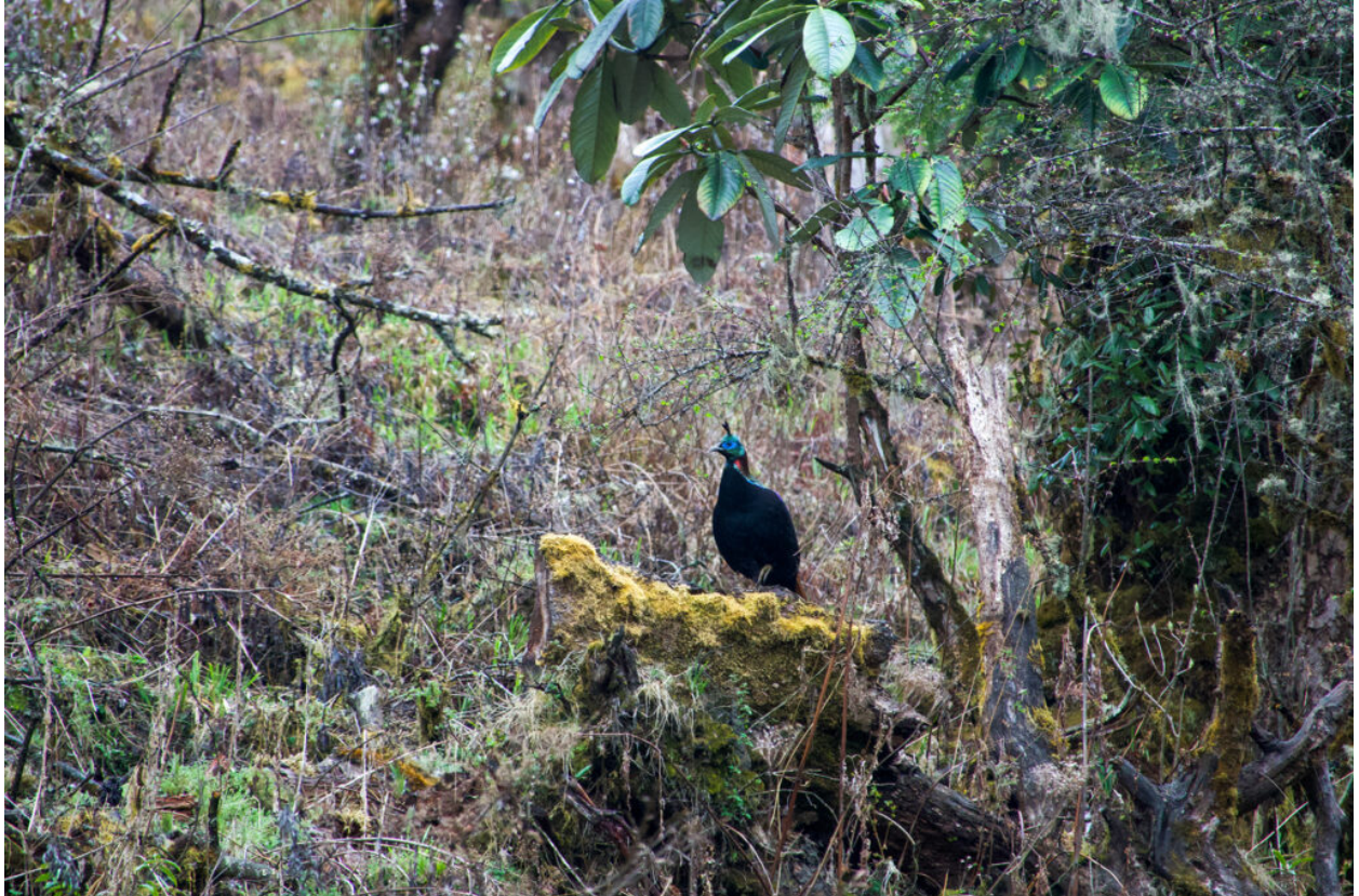
Himalayan Monal