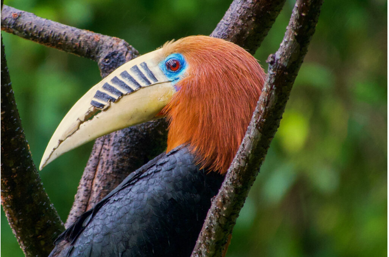
Rufous-necked Hornbill