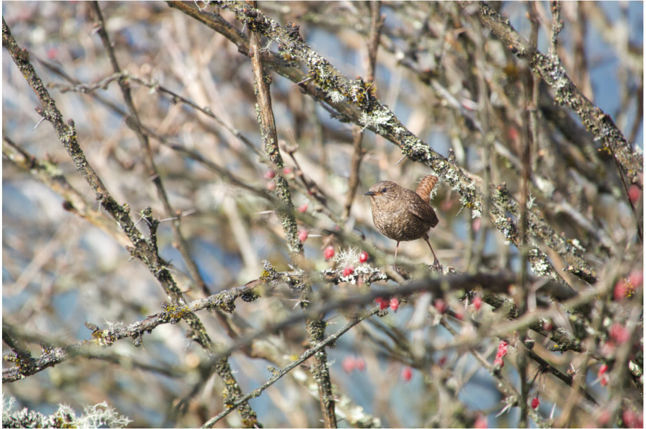
Eurasian Wren