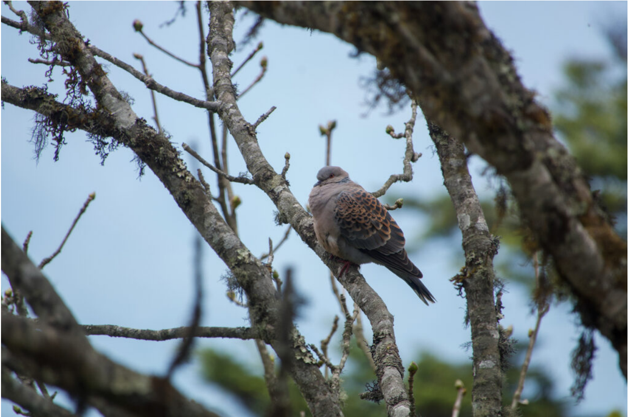
Oriental Turtle Dove (image by Craig Robson)