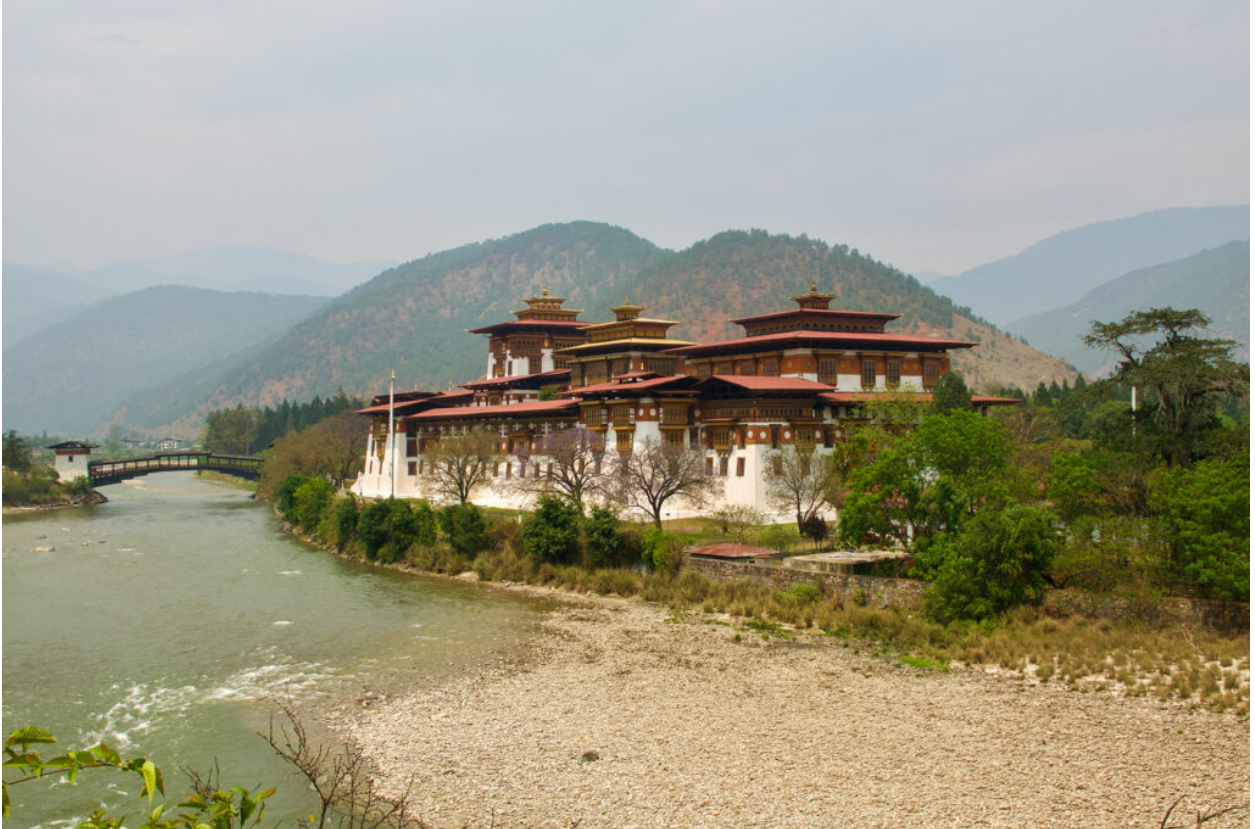
Punakha Dzong