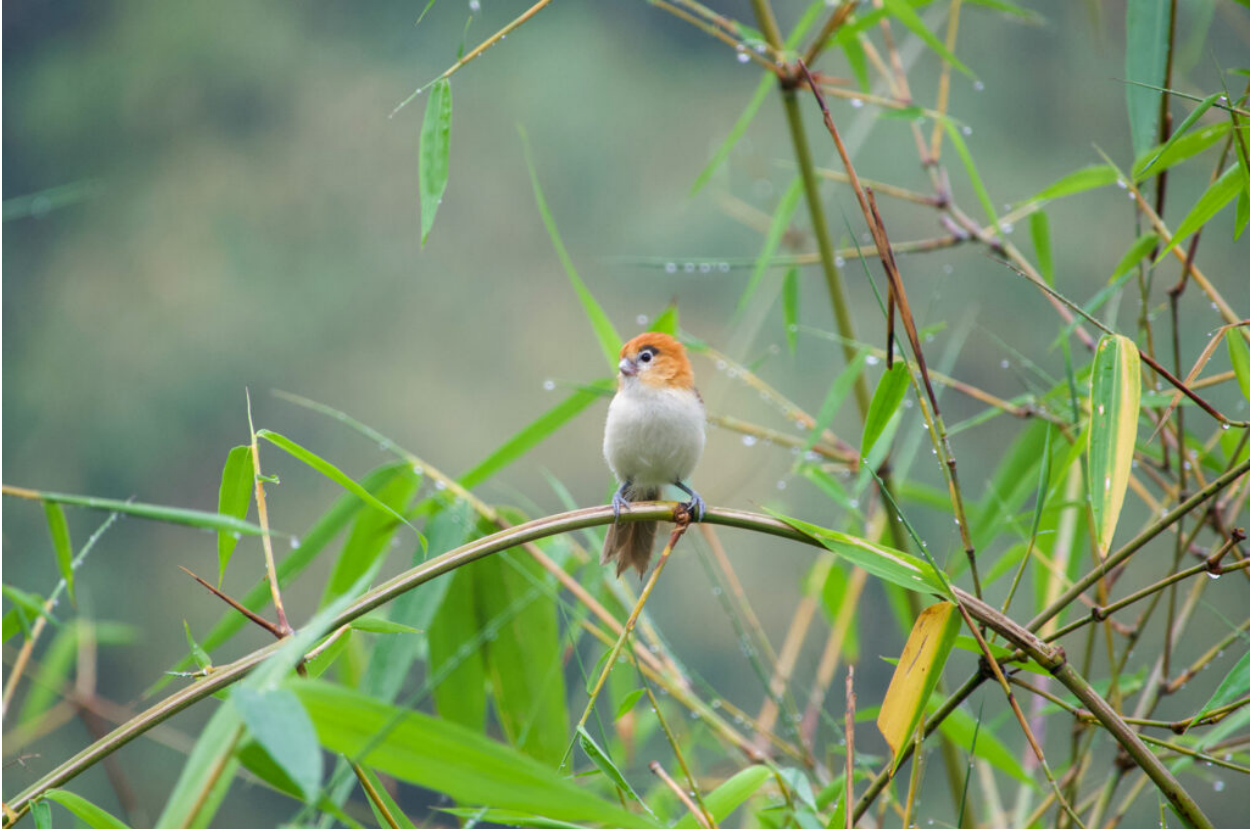
Pale-billed Parrotbill