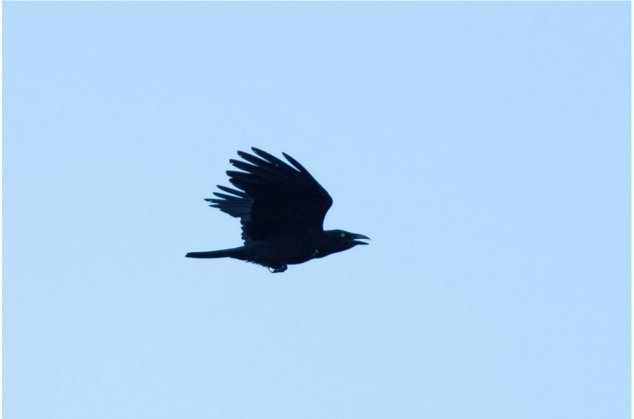
Torresian Crow is a surprisingly scarce bird in Tanimbar