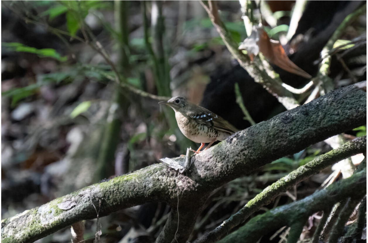
The shy endemic Fawn-breasted Thrush in Tanimbar