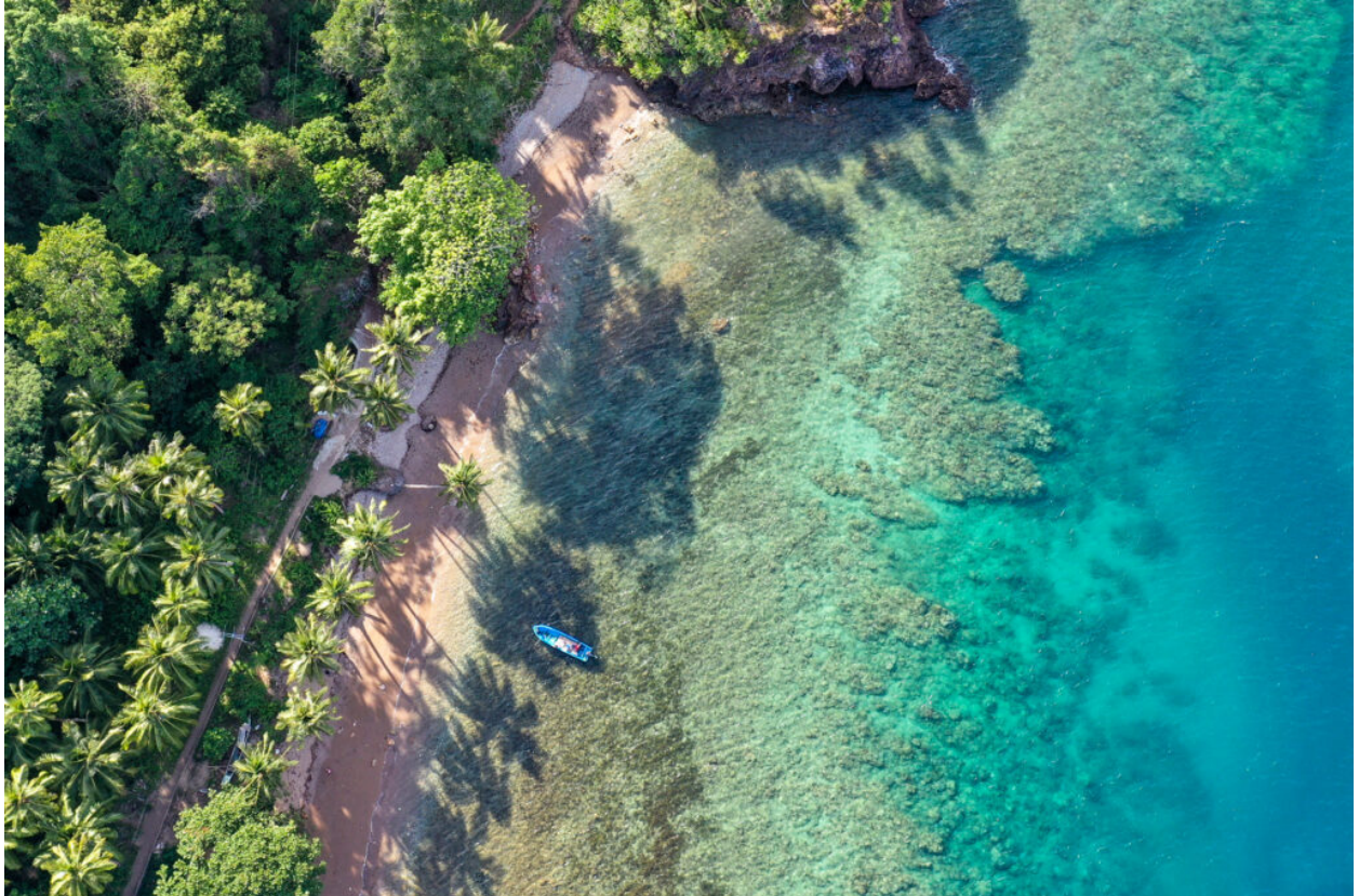
Beautiful coral reefs come right to the shoreline in the Banda Sea, like this one on Damar