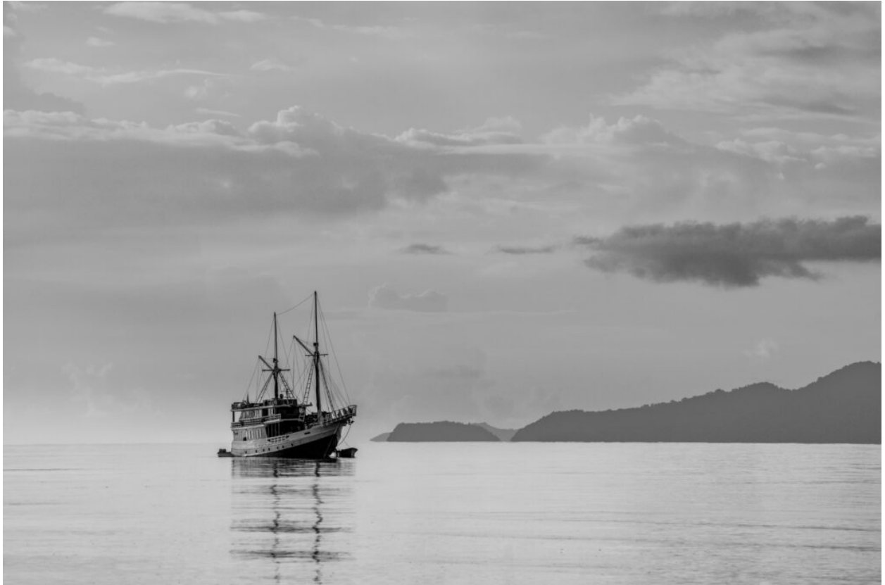
Lady Denok, our wonderful home from home