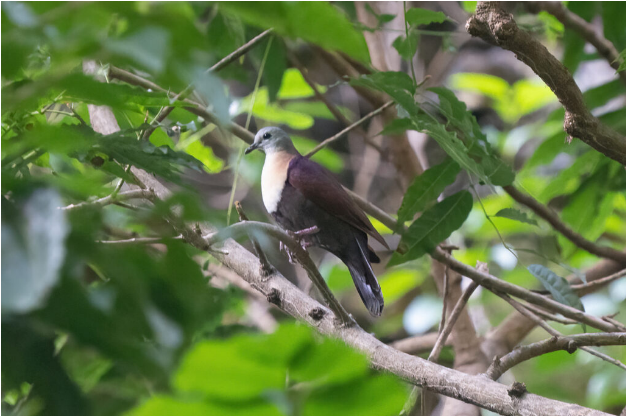
The retiring, near-endemic Wetar Ground Dove, one of the most sought-after specialities