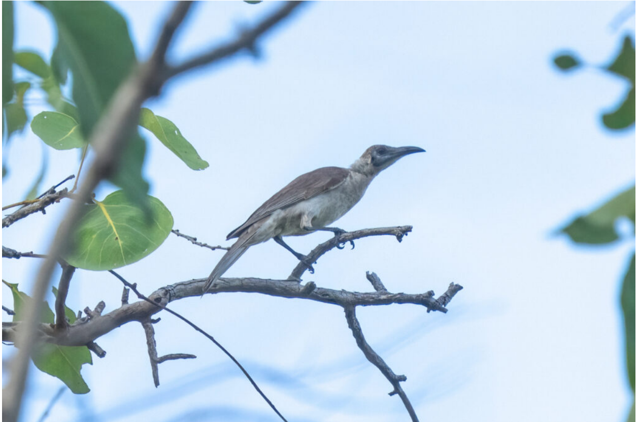
The endemic Grey (or Kisar) Friarbird