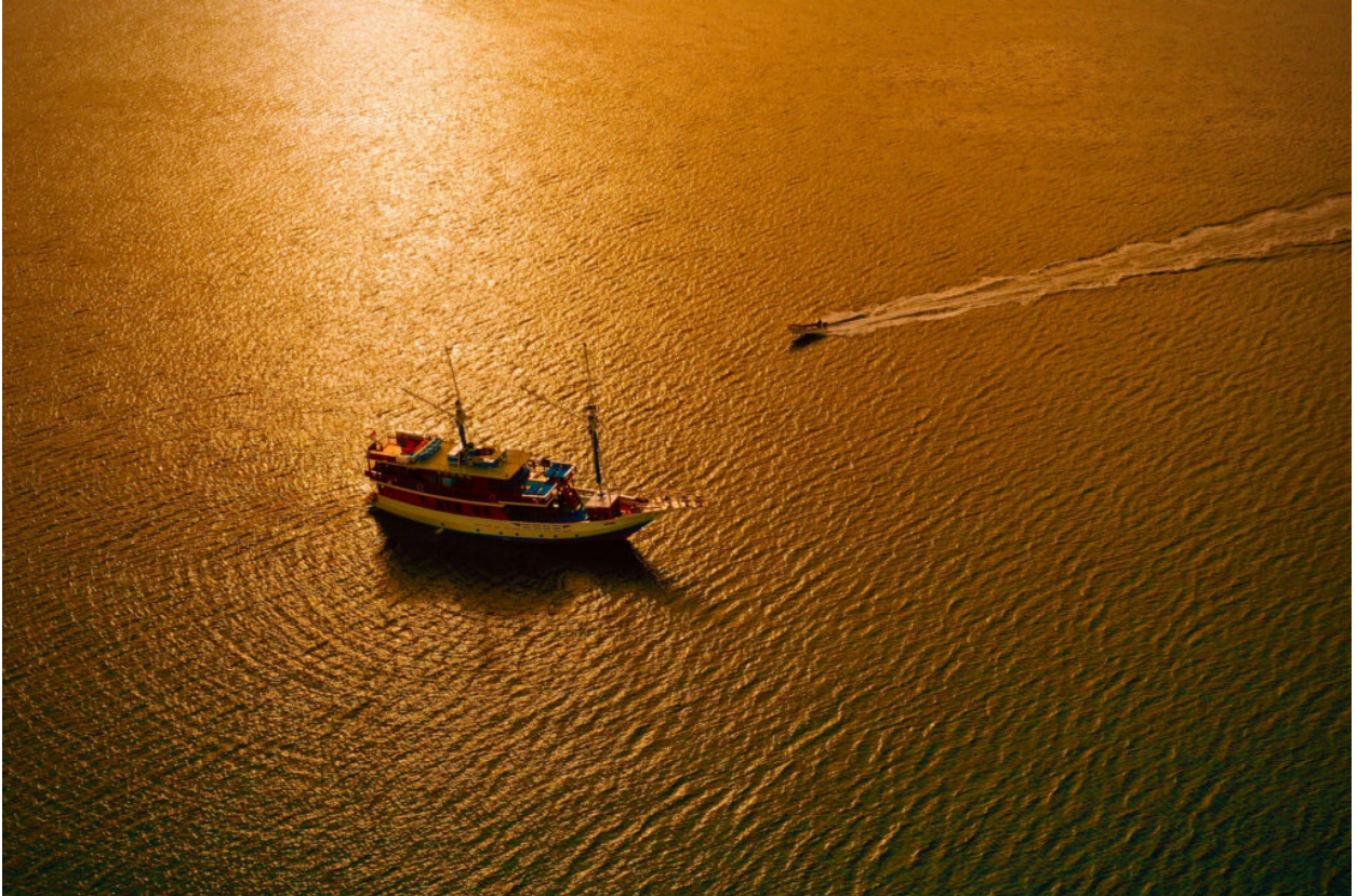
Lady Denok at sunset