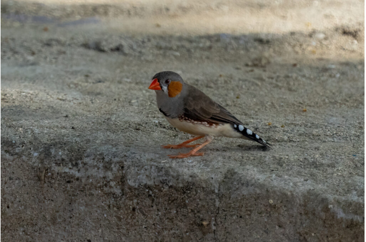
Sunda Zebra Finch