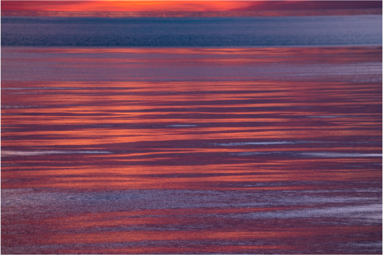
The glassy waters of the Banda Sea reflect the post-sunset colours