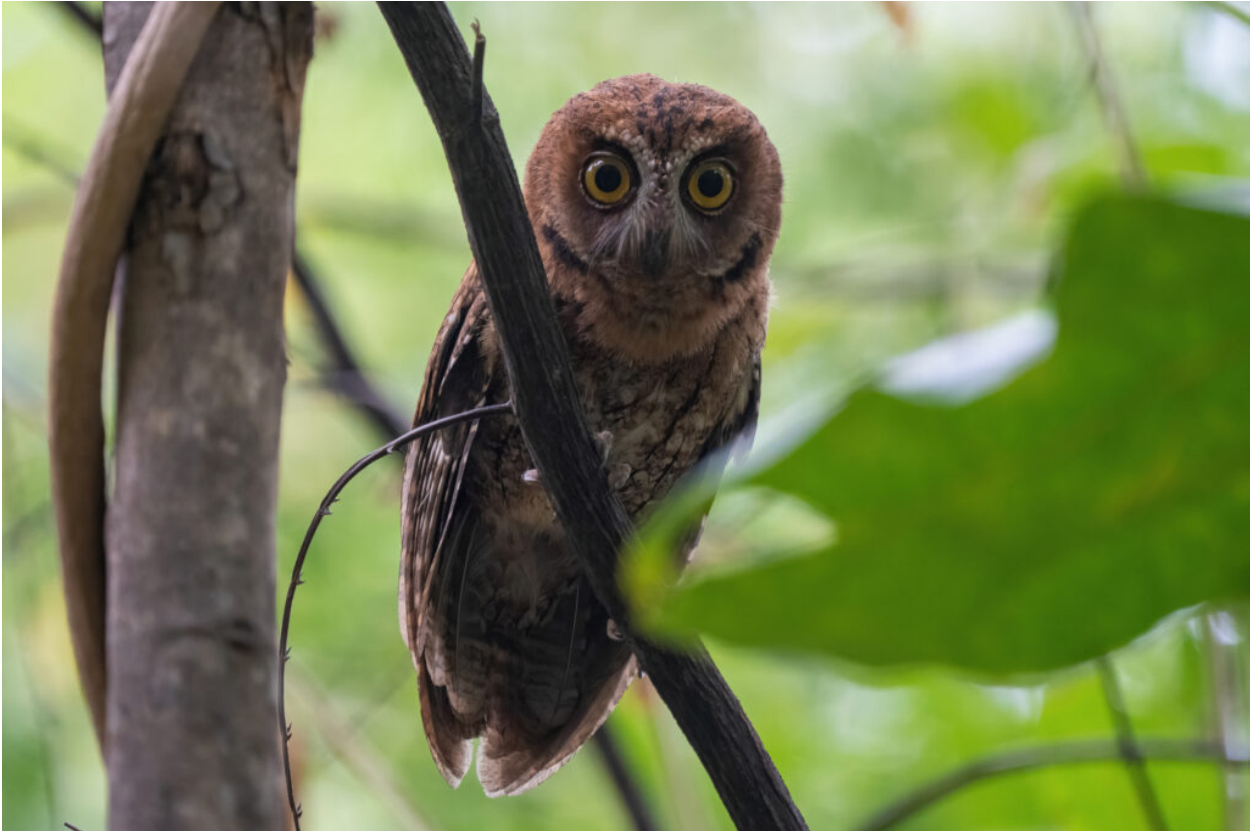
The endemic Wetar Scops Owl comes out to play long before dusk