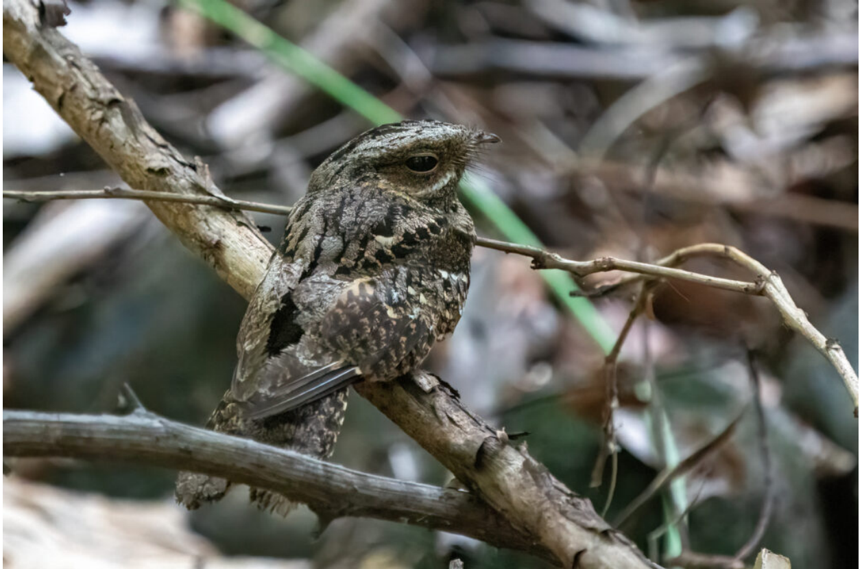
Timor Nightjar on Wetar