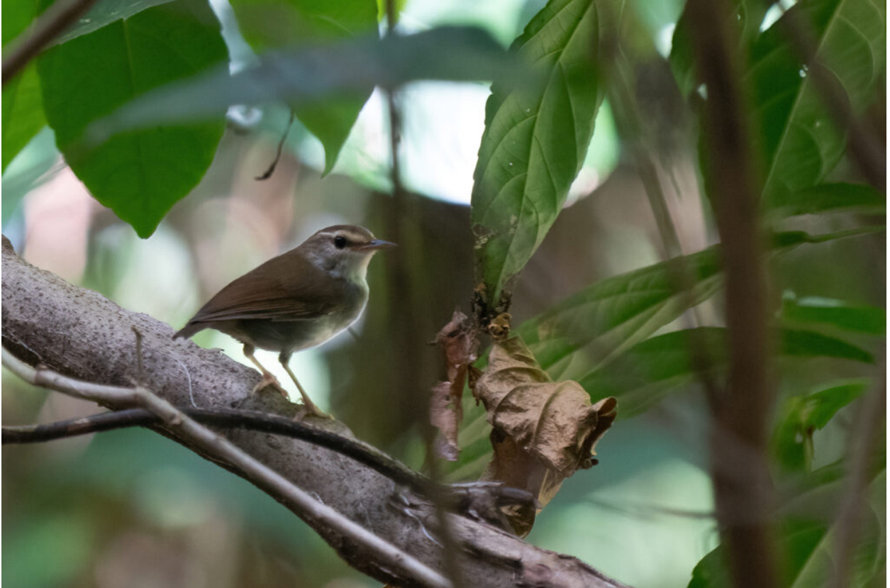
The shy Timor Stubtail