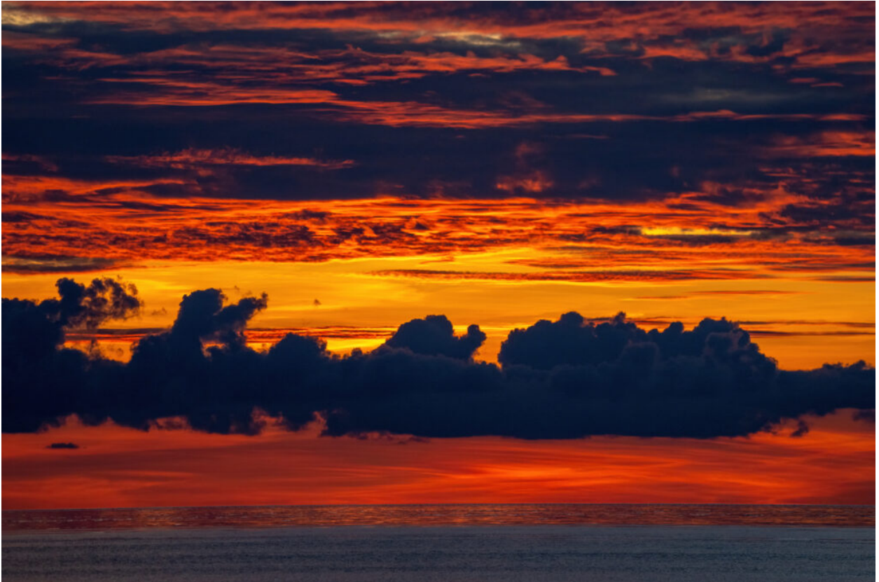
Sunset over the Banda Sea