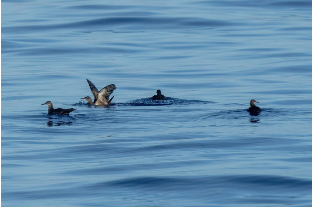
Four Heinroth's Shearwaters together in the Banda Sea