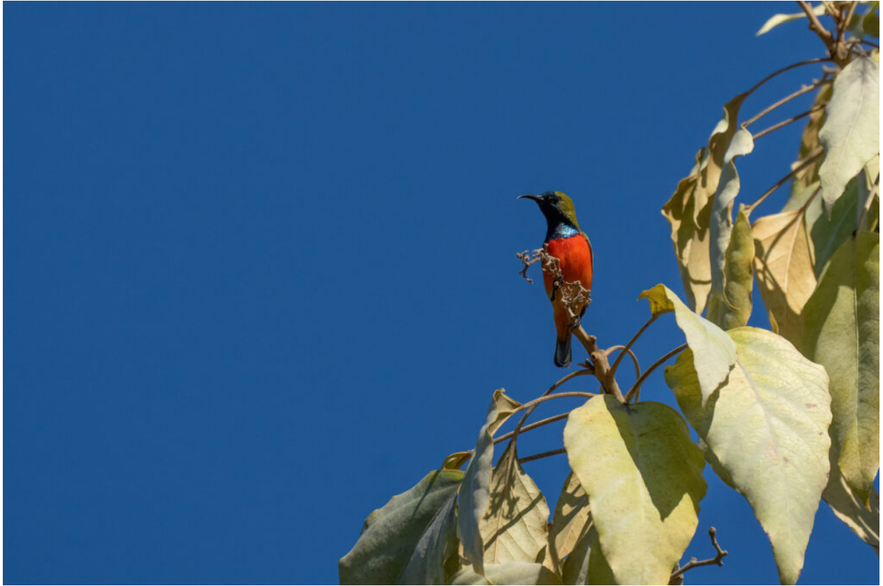
The lovely Flame-breasted Sunbird