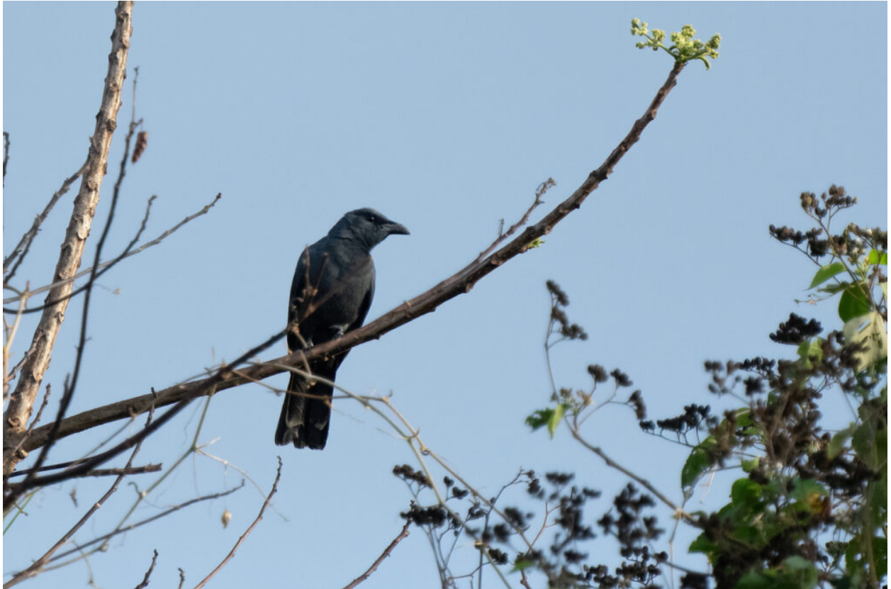
Wallacean Cuckooshrike of the form unimoda in Tanimbar