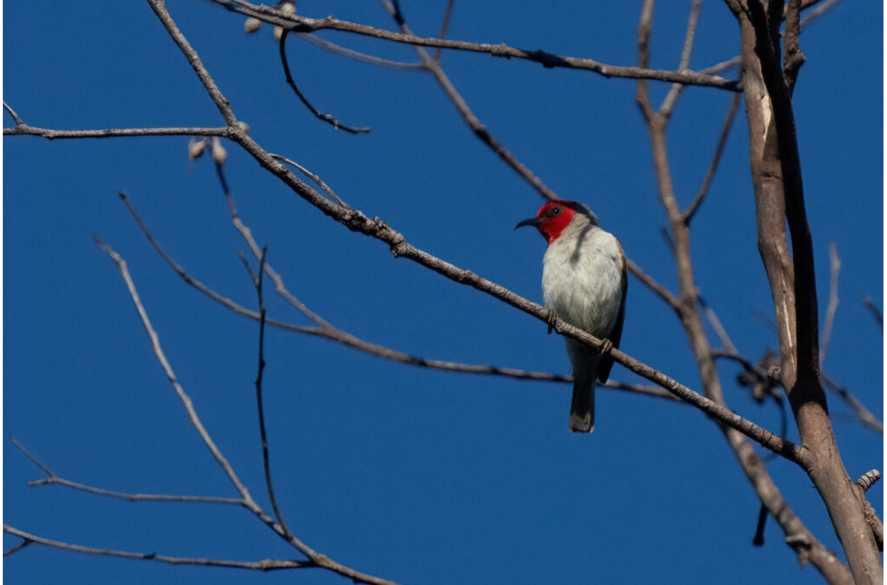
The recently-discovered endemic Alor Myzomela