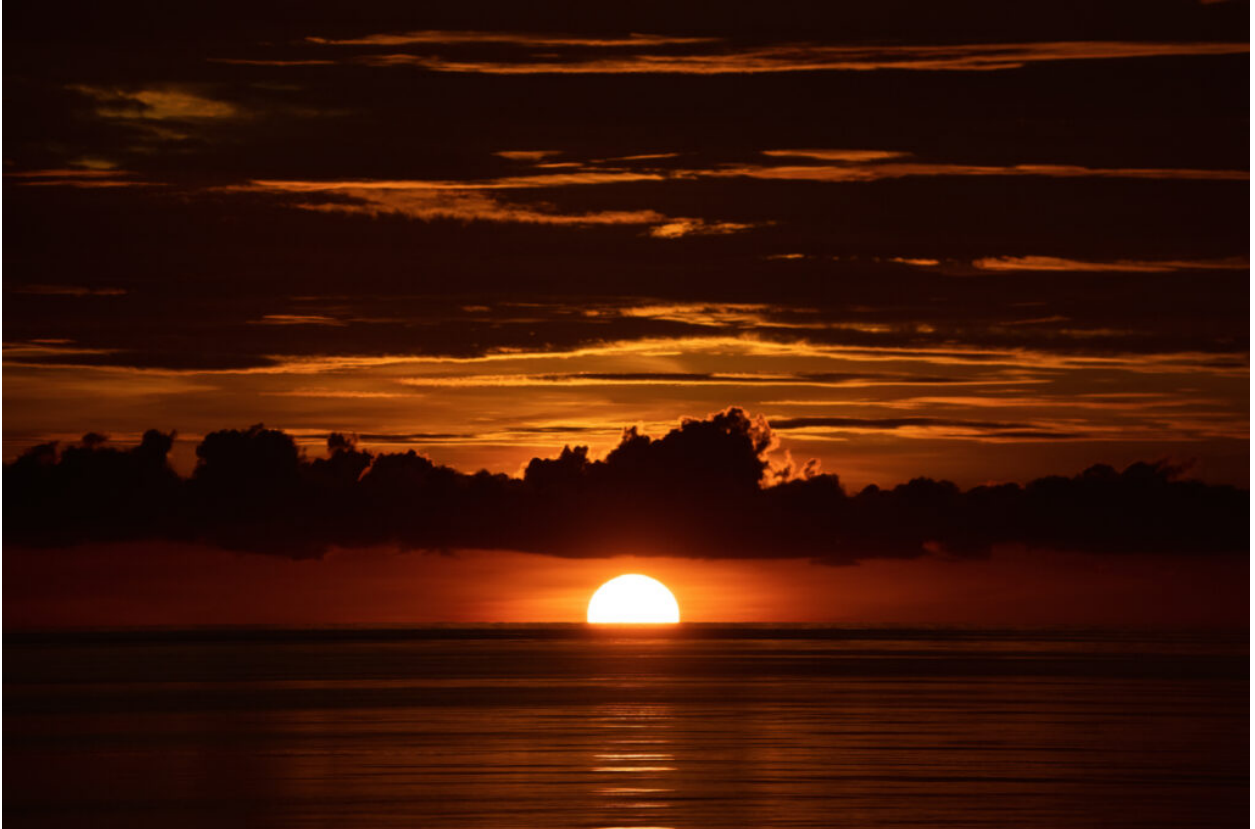
Banda Sea sunset