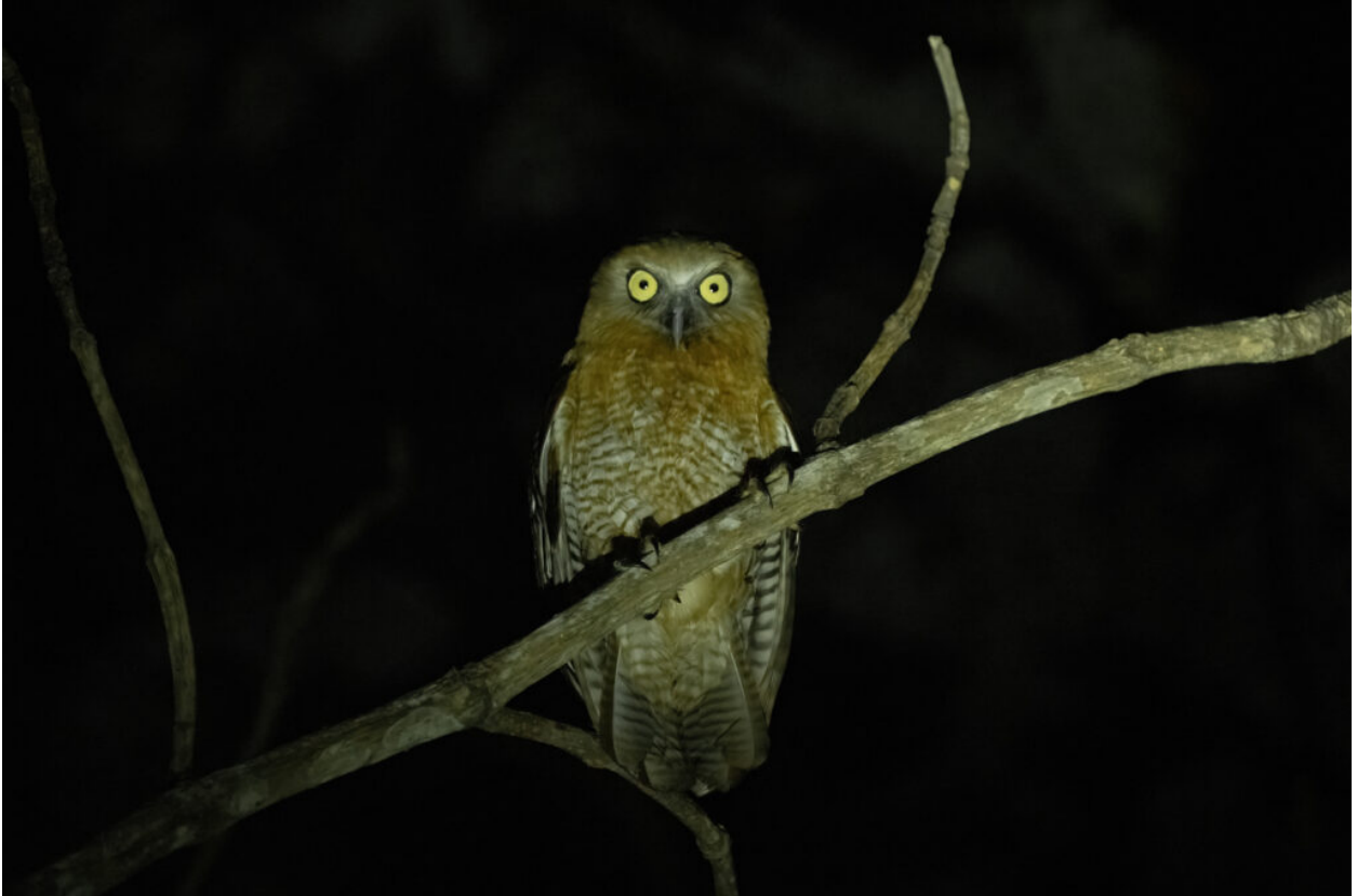
The endemic Tanimbar Boobook