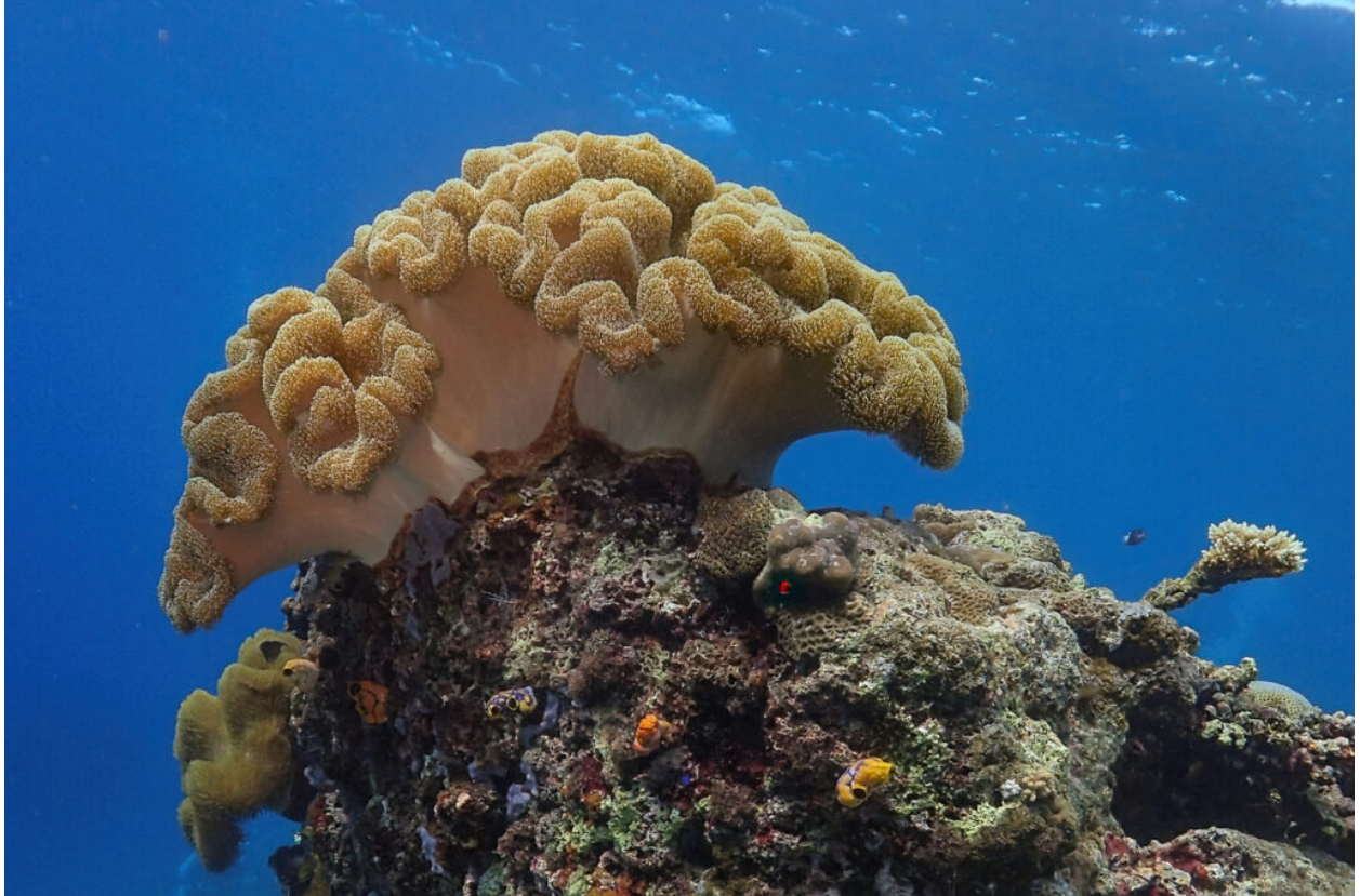
Soft corals are a glory of the Banda Sea