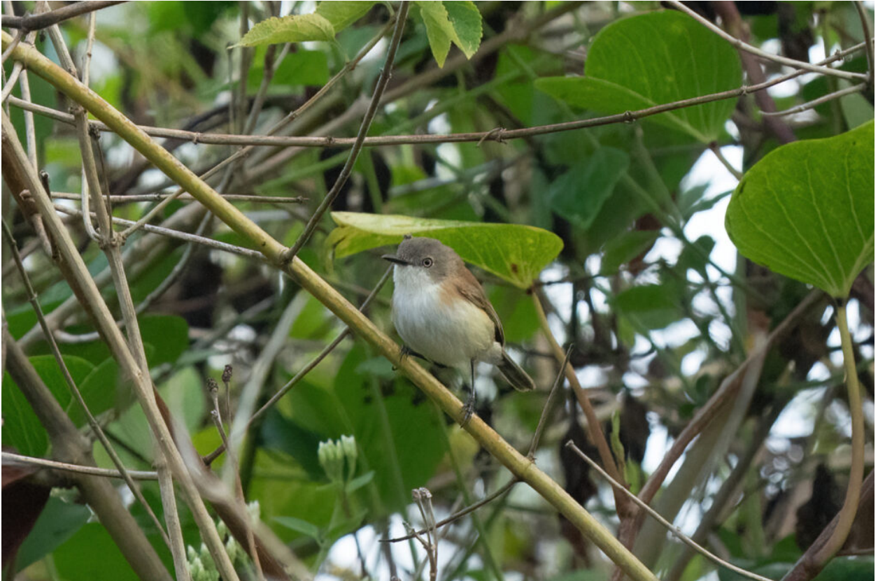
The senex form of the Rufous-sided (or Banda Sea) Gerygone on remote Kalaotoa