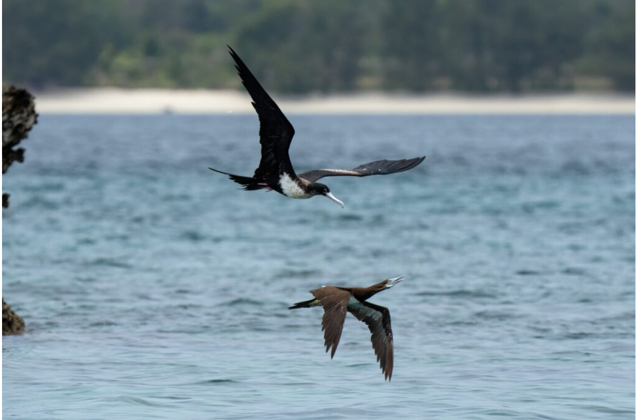
A Great Frigatebird pursues a hapless Brown Booby