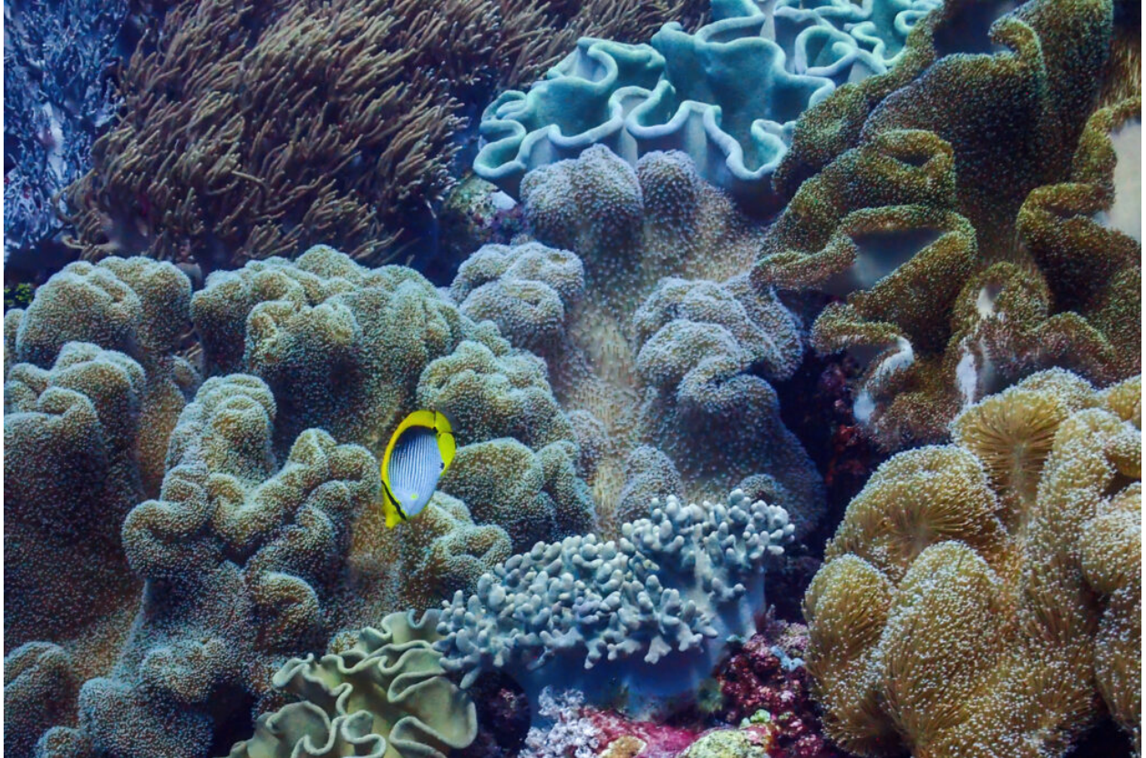
A Spot-tailed Butterflyfish amidst the corals