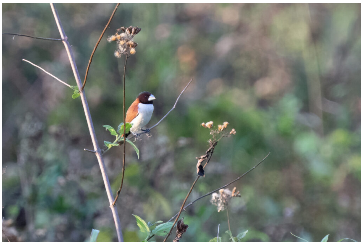
Five-coloured Munia