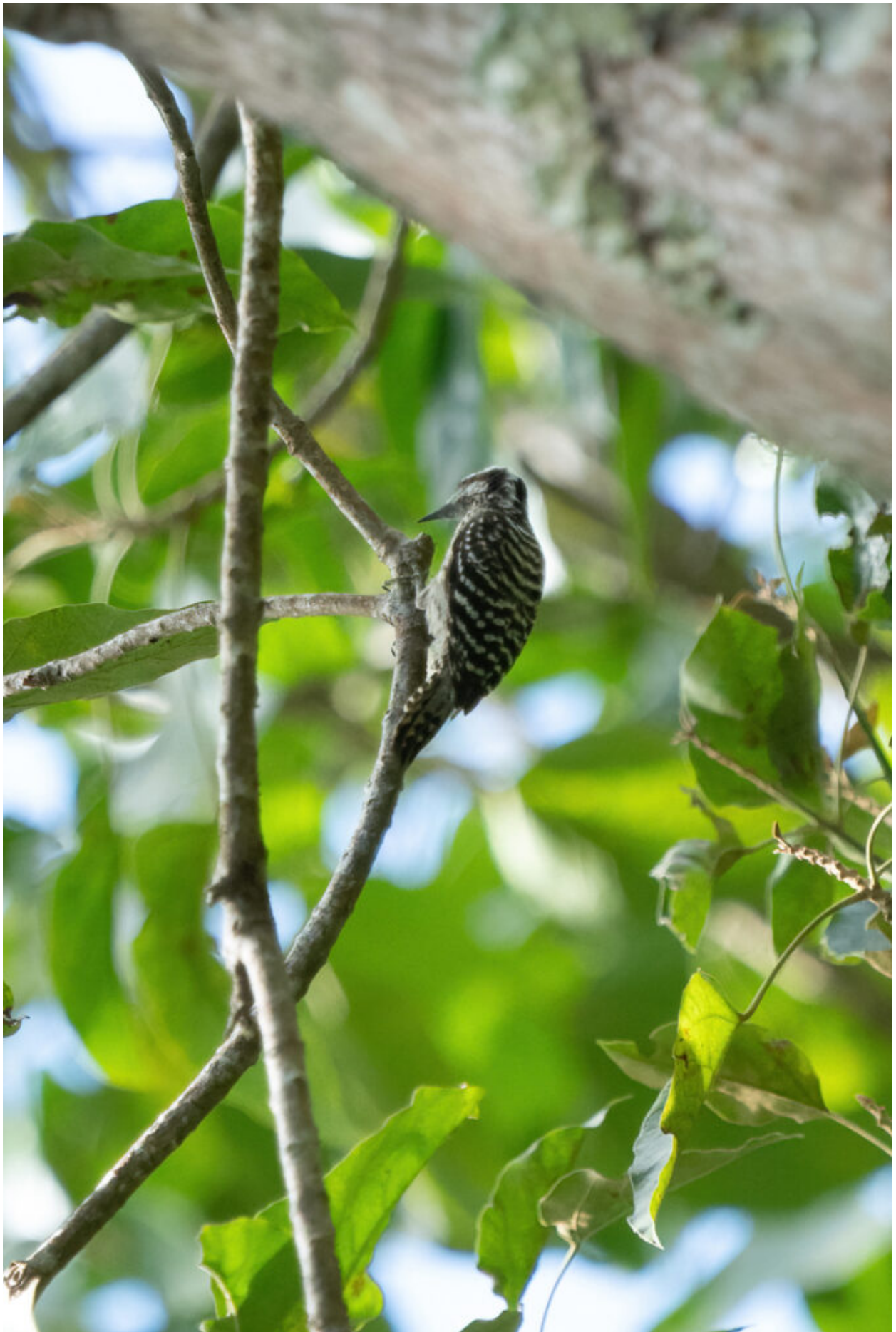
Sunda Pygmy Woodpecker