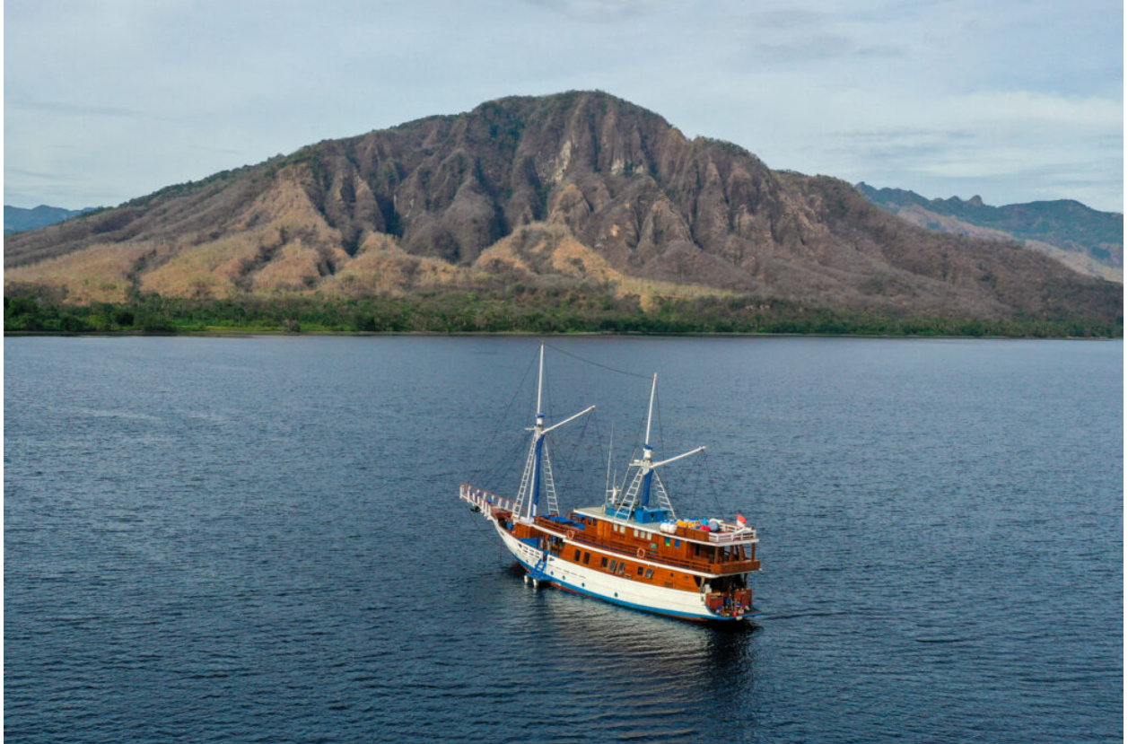
Lady Denok off Wetar in the Banda Sea