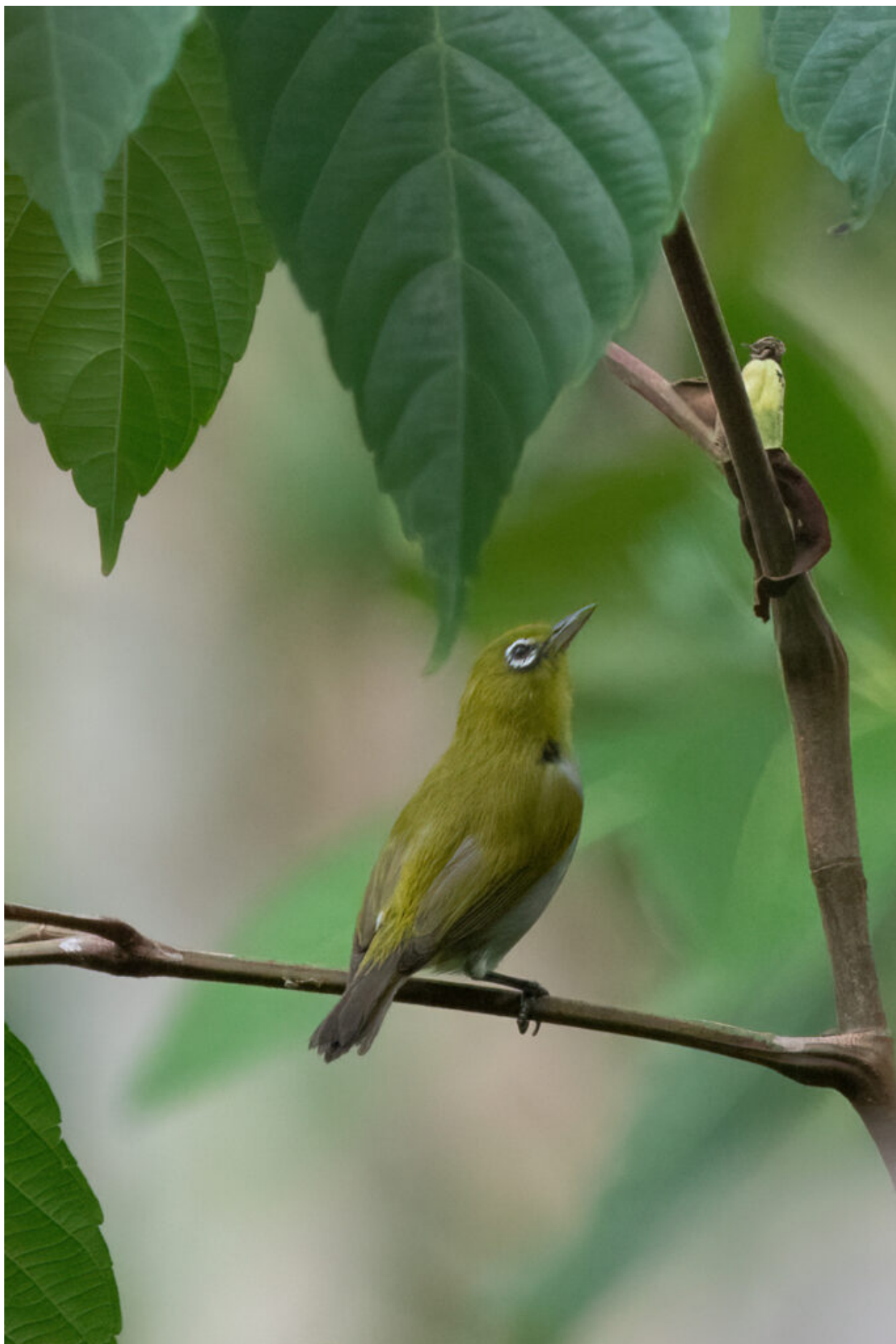
Ashy-bellied White-eye