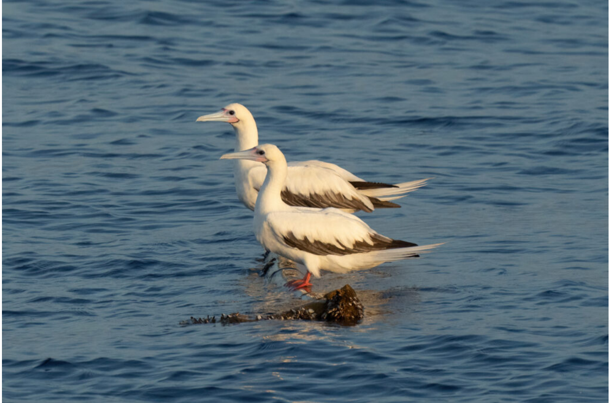
Red-footed Boobies taking a rest on some flotsam