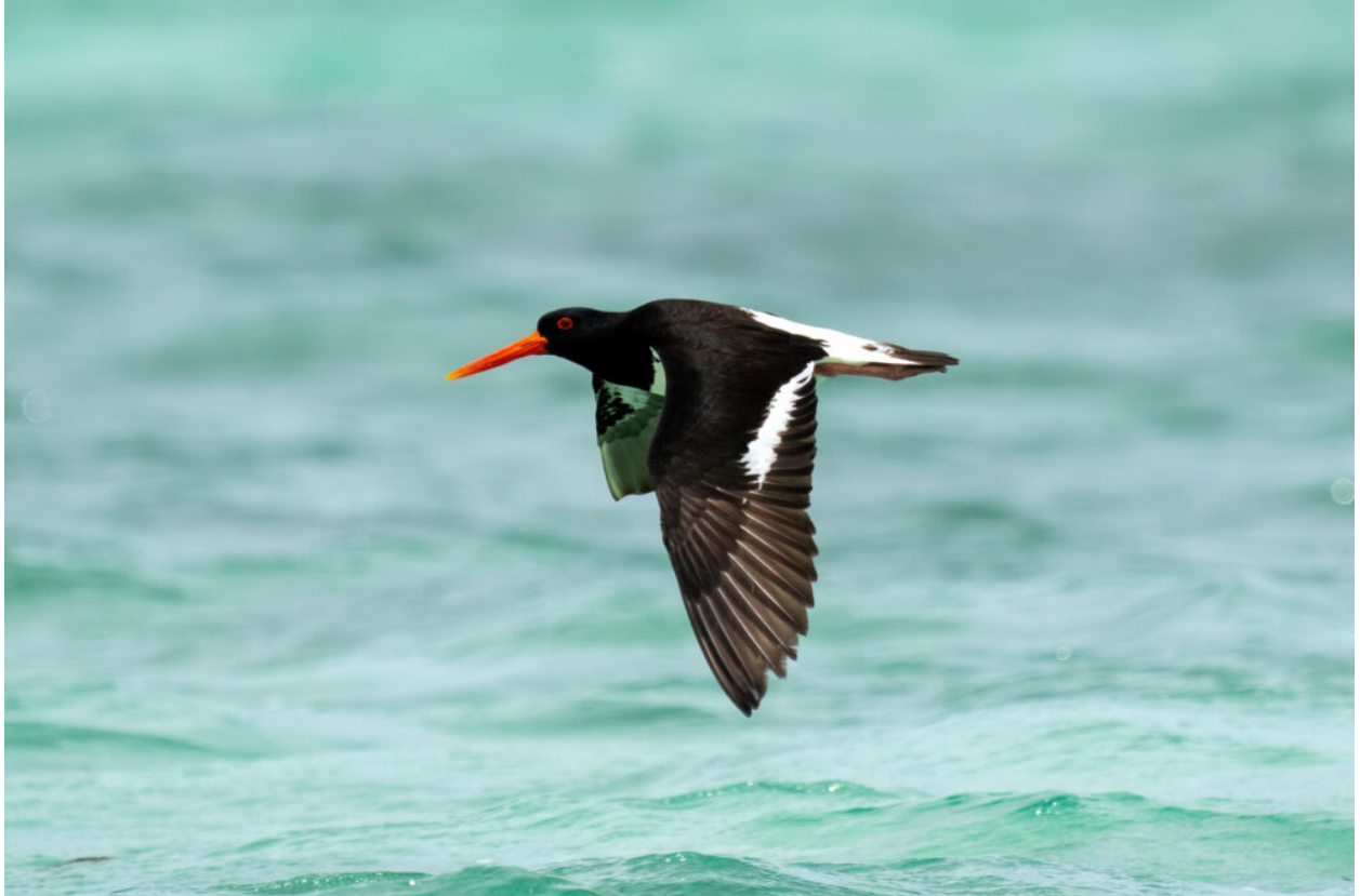
Pied Oystercatcher in Tanimbar is a surprise addition to most people's Asian list!