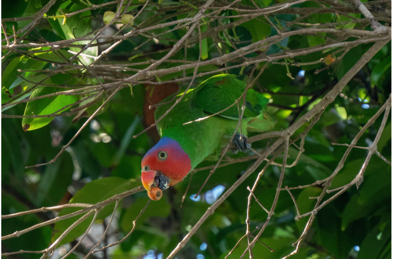
Red-cheeked Parrot of the form timorlaoensis in Tanimbar