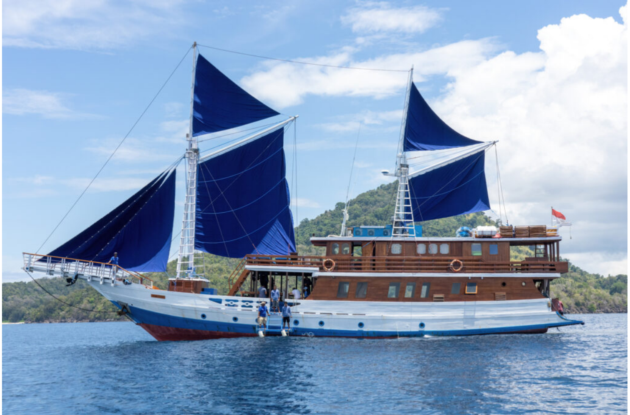
The crew awaiting us with help at the gangway, cool towels and welcome drinks as we return from birding! This is the life!