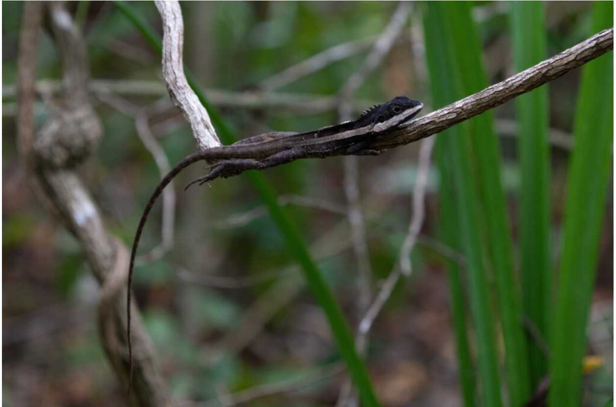
Northern Water Dragon