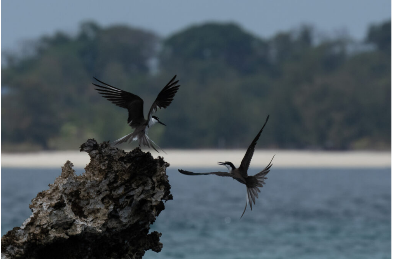
Bridled Terns