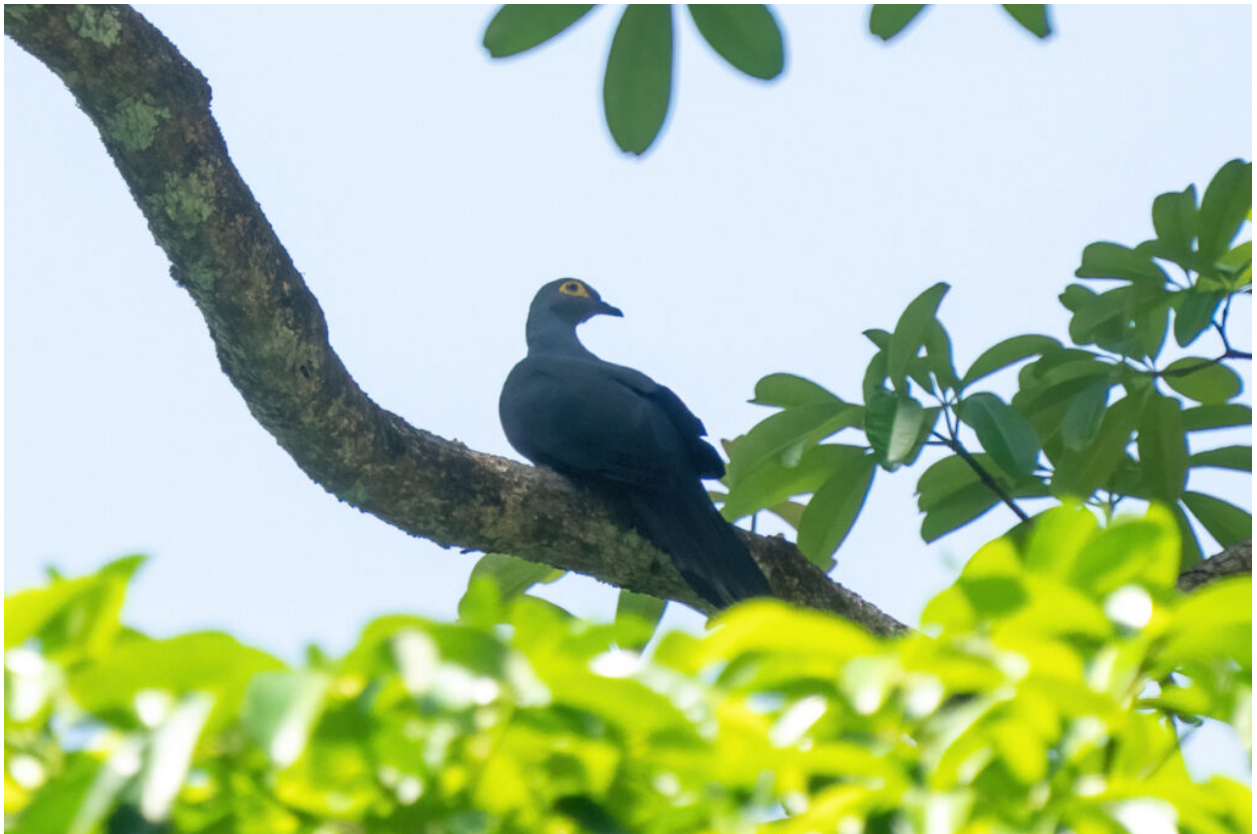
Black Cuckoo-Dove is a common bird on Wetar