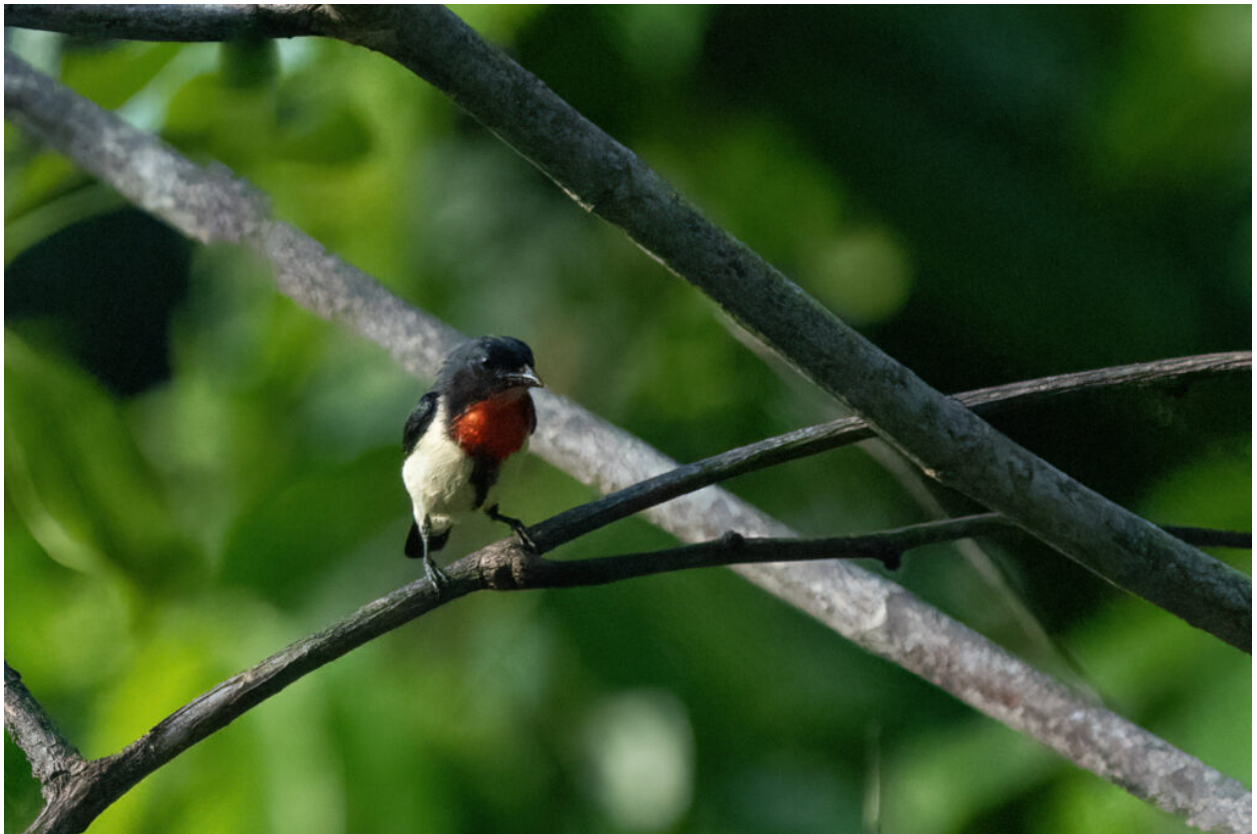
Blue-cheeked (or Red-chested) Flowerpecker of the nominate form