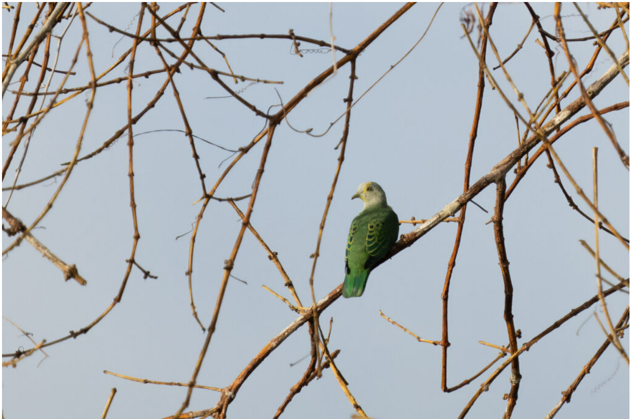
Some of the forms of Rose-crowned Fruit Dove, like xanthogaster, lack a rosy crown!