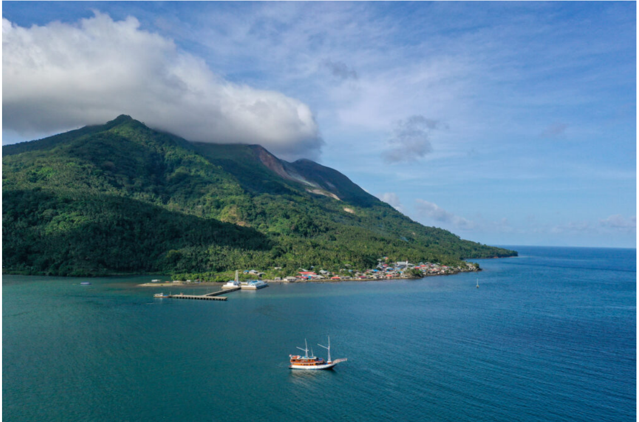
Lady Denok below the volcano on Damar