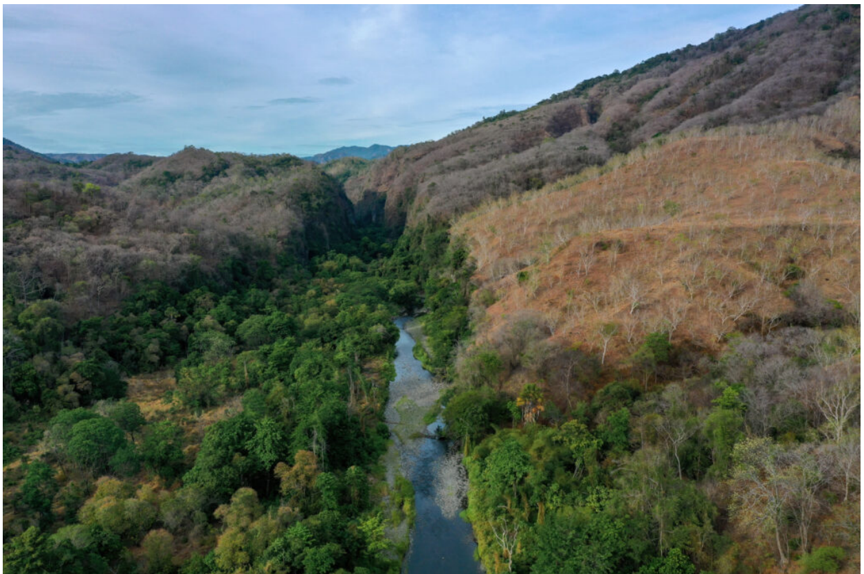
A remote canyon on the island of Wetar