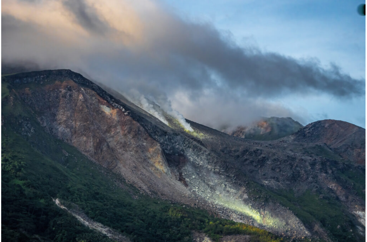
The active volcano on remote Damar in the Banda Sea