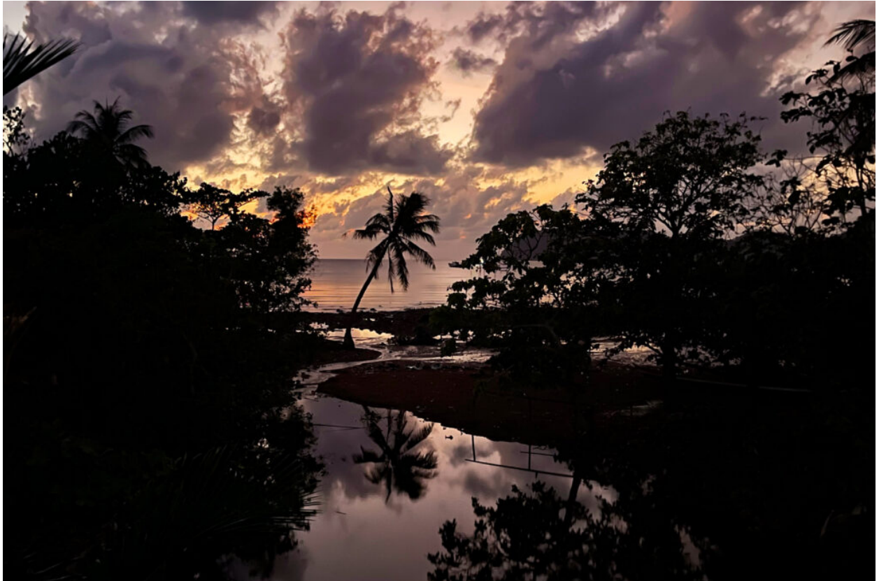
Damar at sunrise