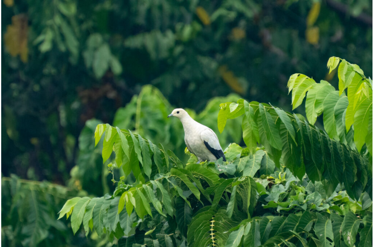
Pied Imperial Pigeon