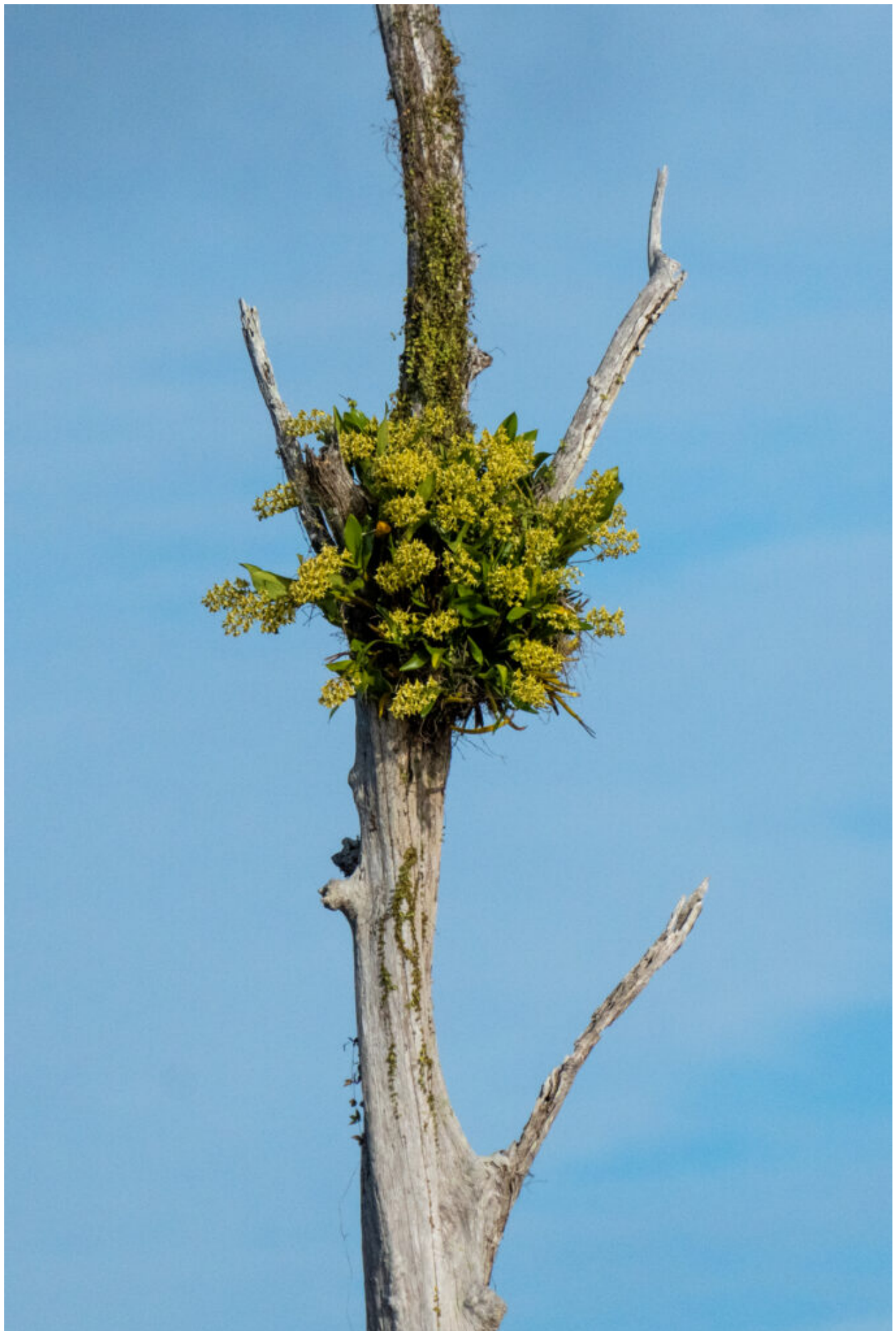
A beautiful tree orchid, Dendrobium speciosum