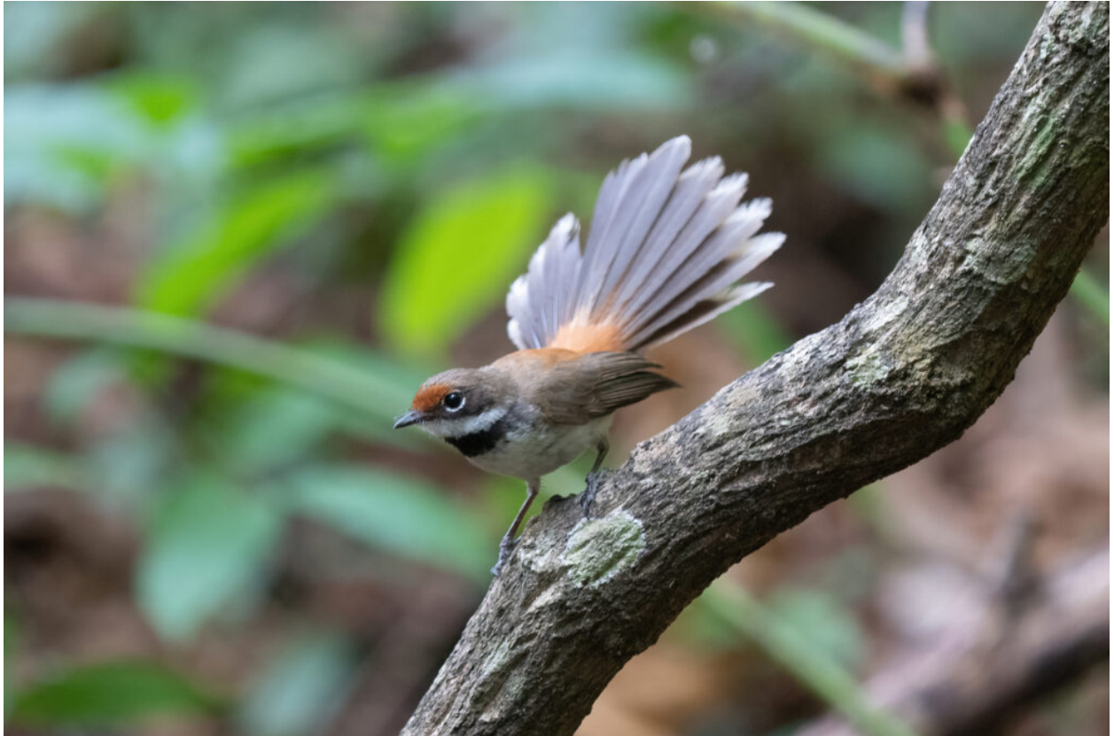
Arafura (or Supertramp) Fantail of the form semicollaris on Wetar