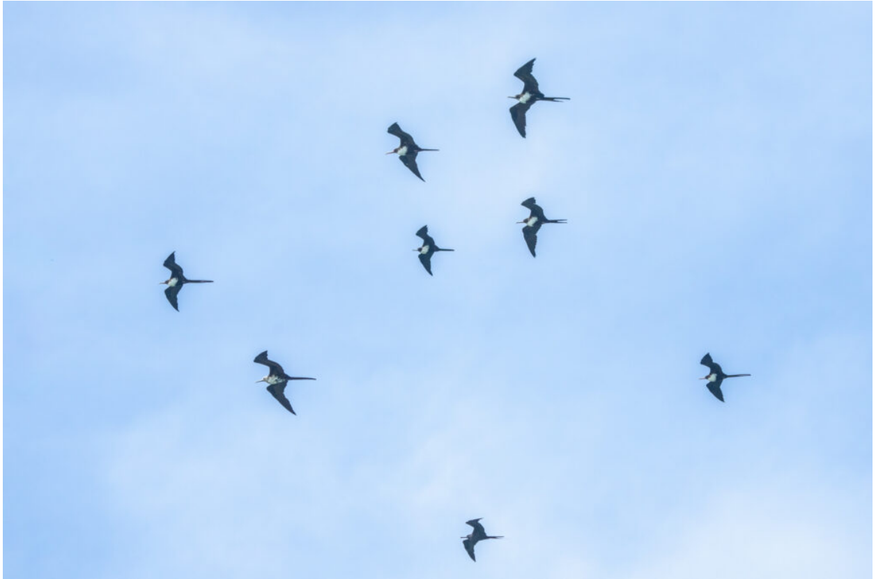
Great Frigatebirds lie in wait