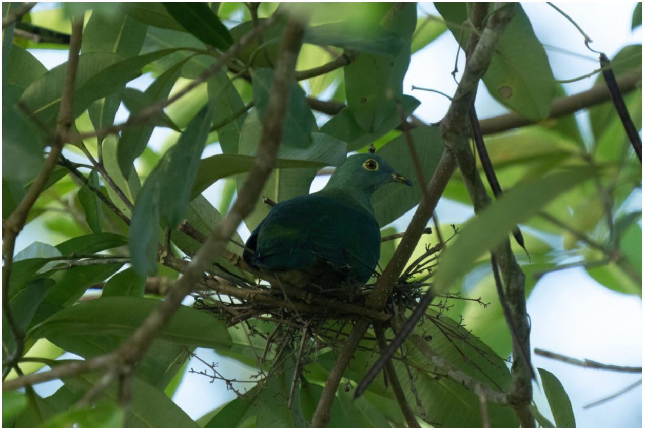
A female Black-naped Fruit Dove on its flimsy nest