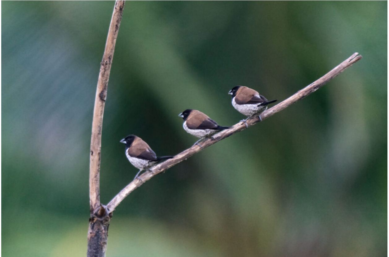
Black-faced Munias