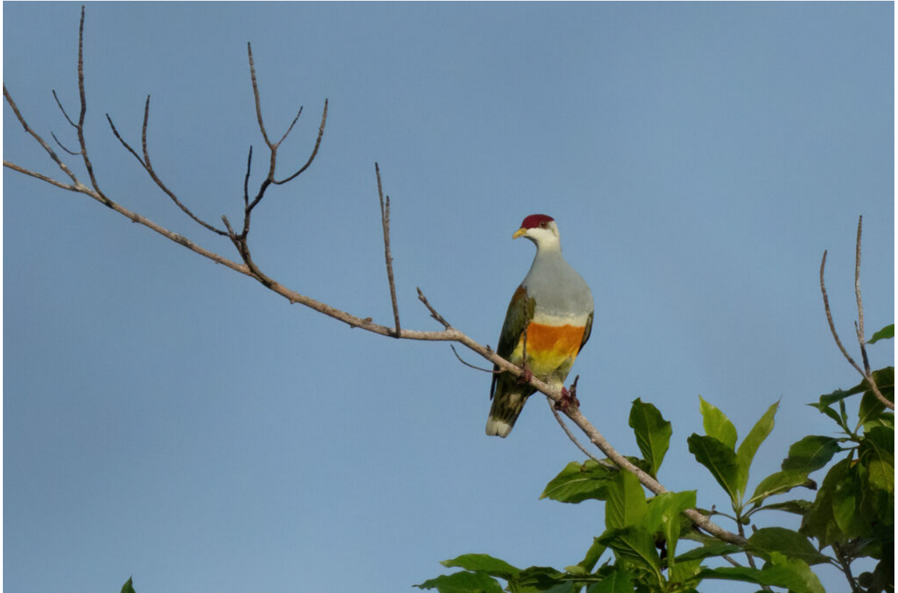
The beautiful Wallace's Fruit Dove