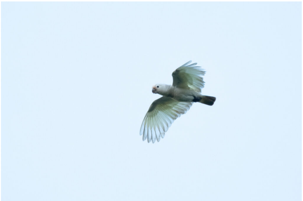
The endemic Tanimbar Corella (or Tanimbar Cockatoo)