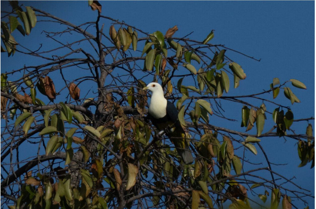
The beautiful Banded (or Black-banded) Fruit Dove of the rarely-seen form lettiensis on Leti