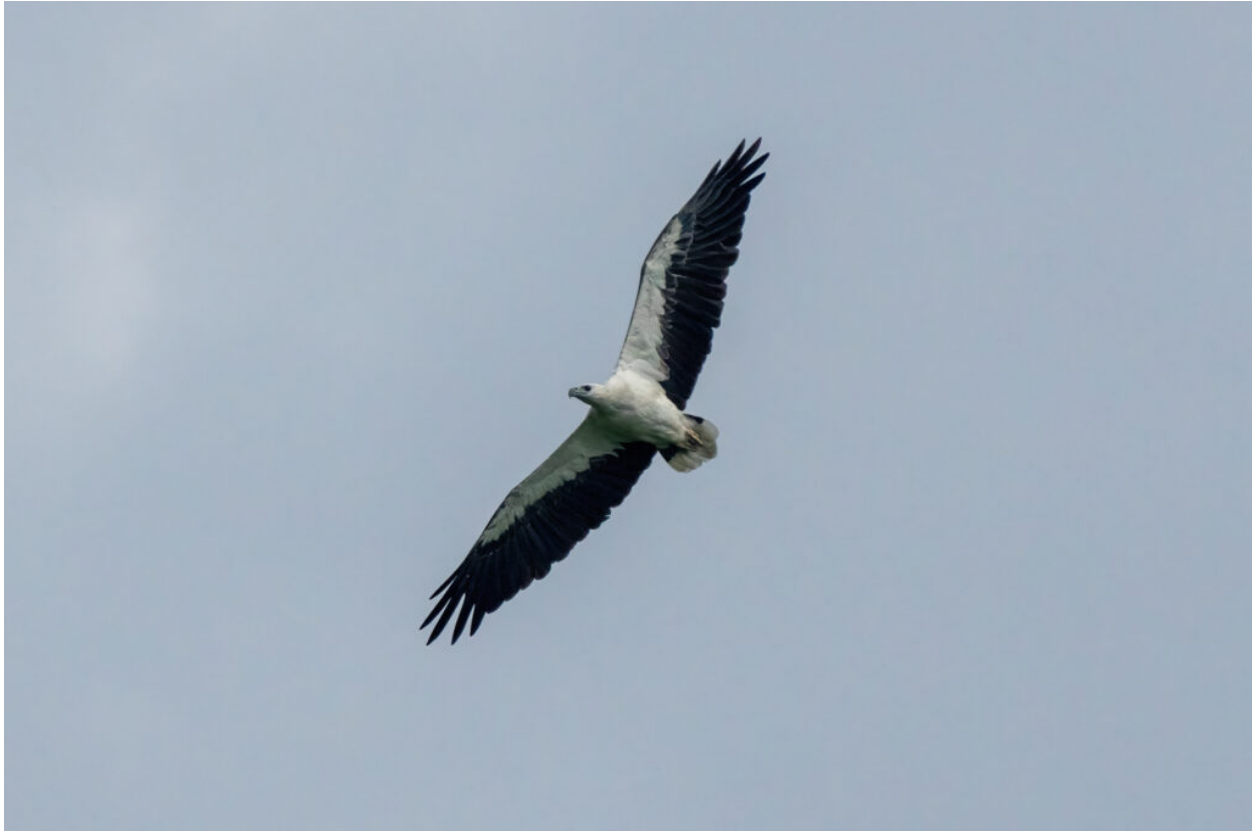
White-bellied Sea Eagle