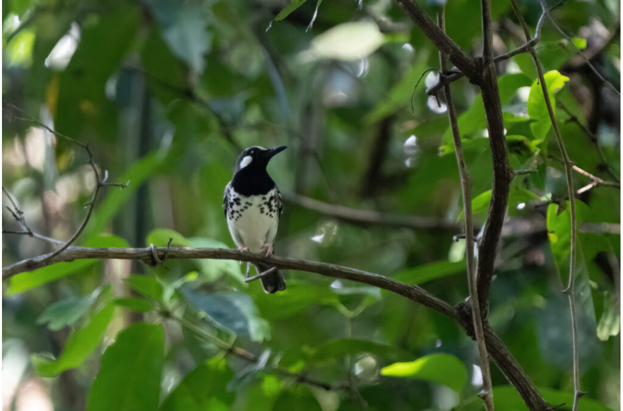
The endemic Slaty-backed Thrush in Tanimbar