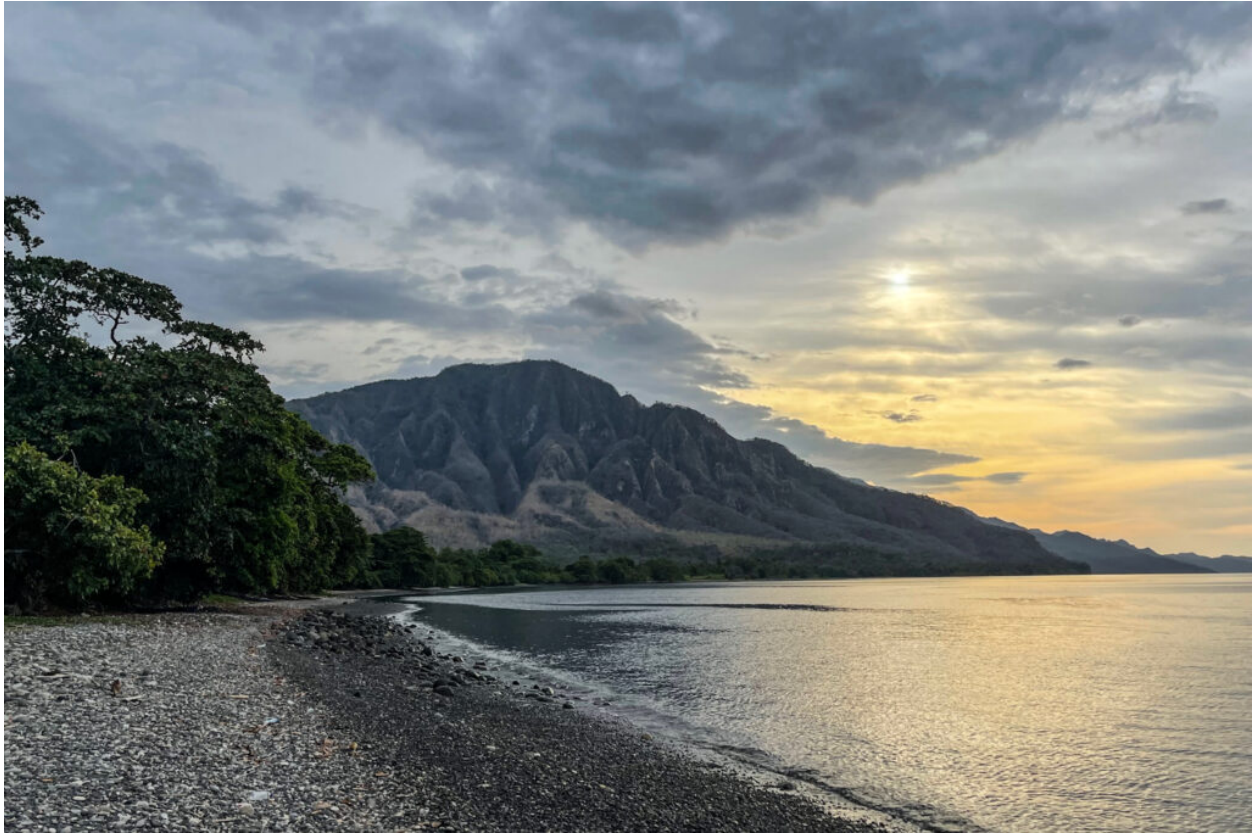
Wetar coastline