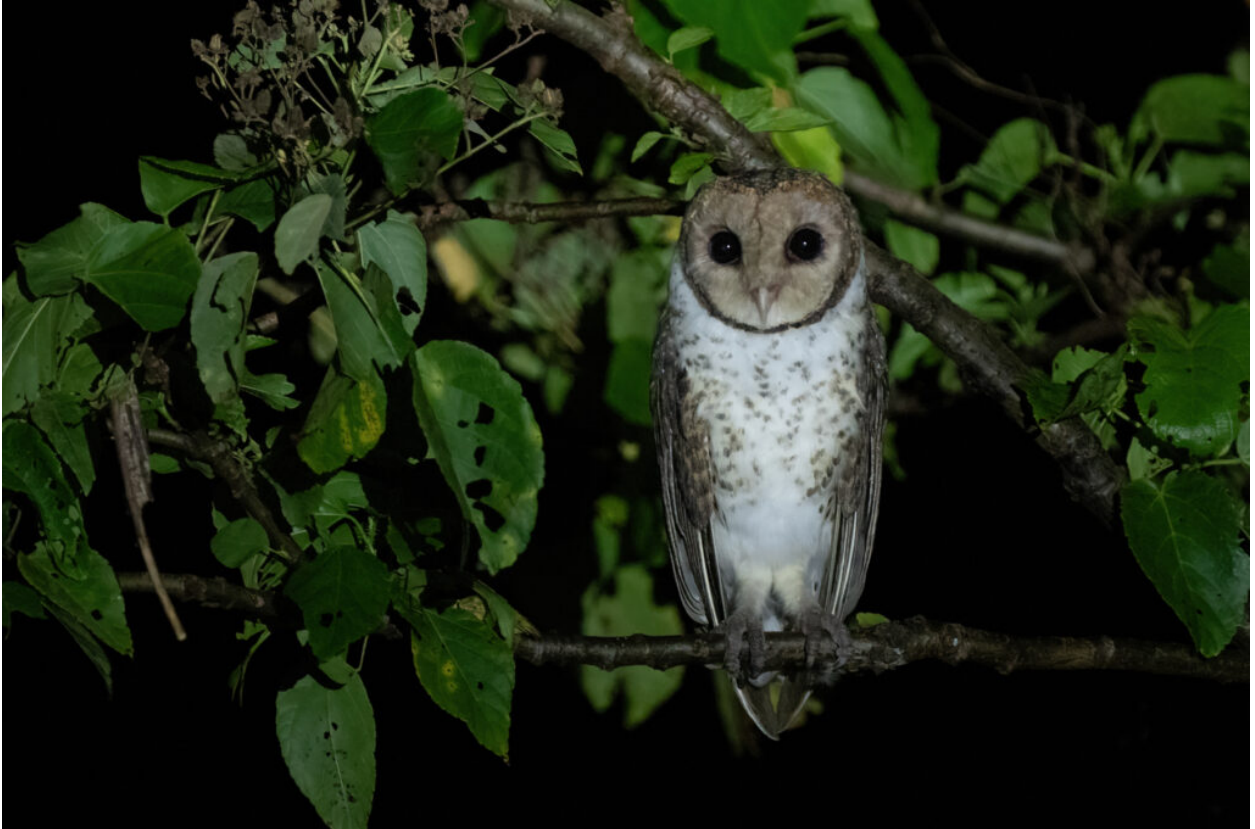
Moluccan Masked Owl is a difficult and sought-after species