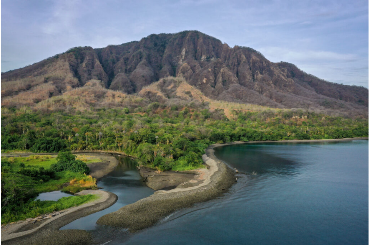
The spectacular scenery of sparsely-inhabited Wetar