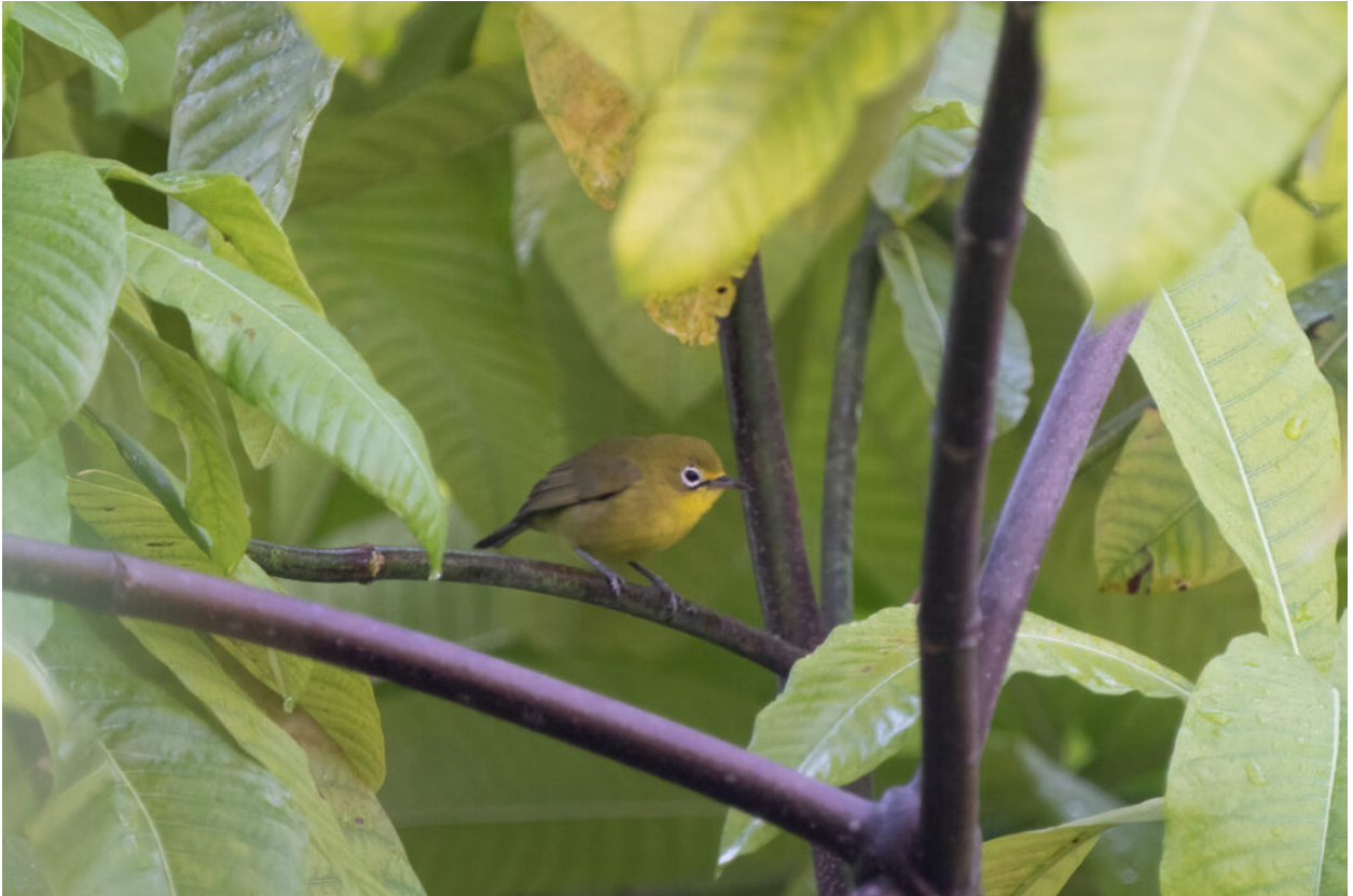
Lemon-bellied White-eye