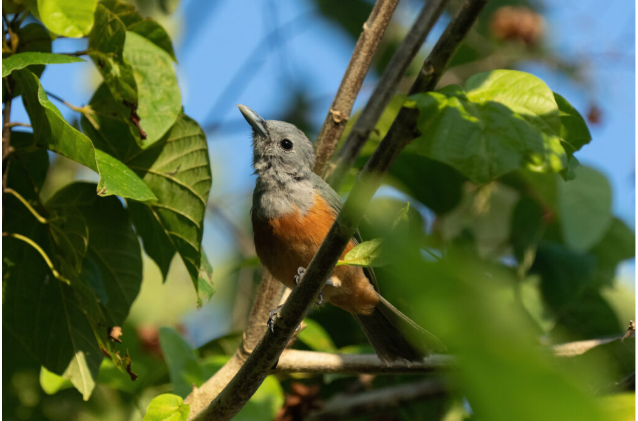
Island Monarch