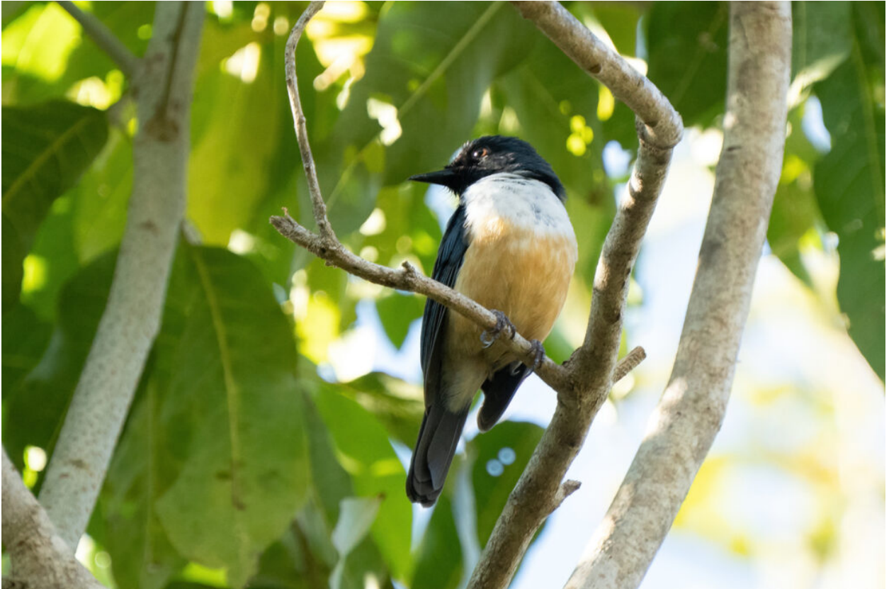
The endemic Kalao Blue Flycatcher (or Kalao Jungle Flycatcher)