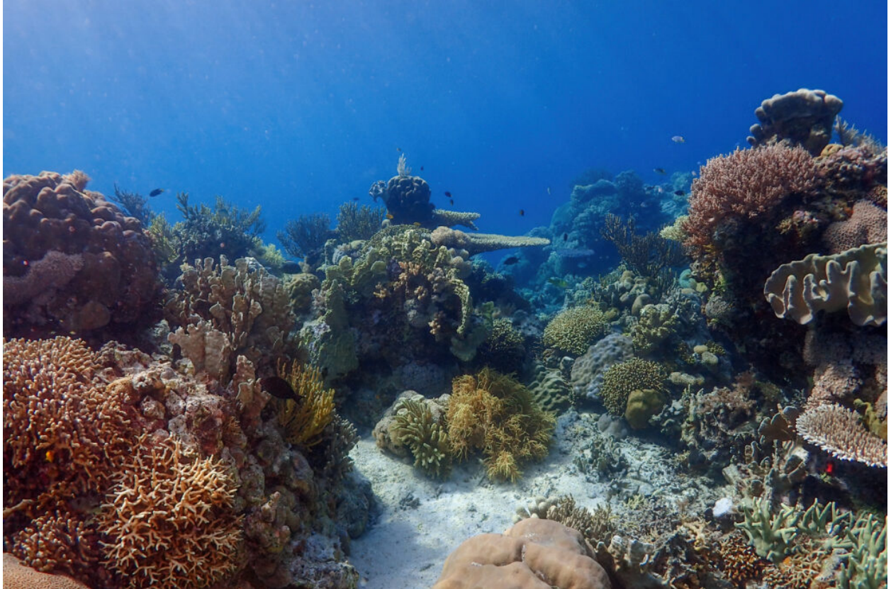
The coral reefs of the Banda Sea are legendary!