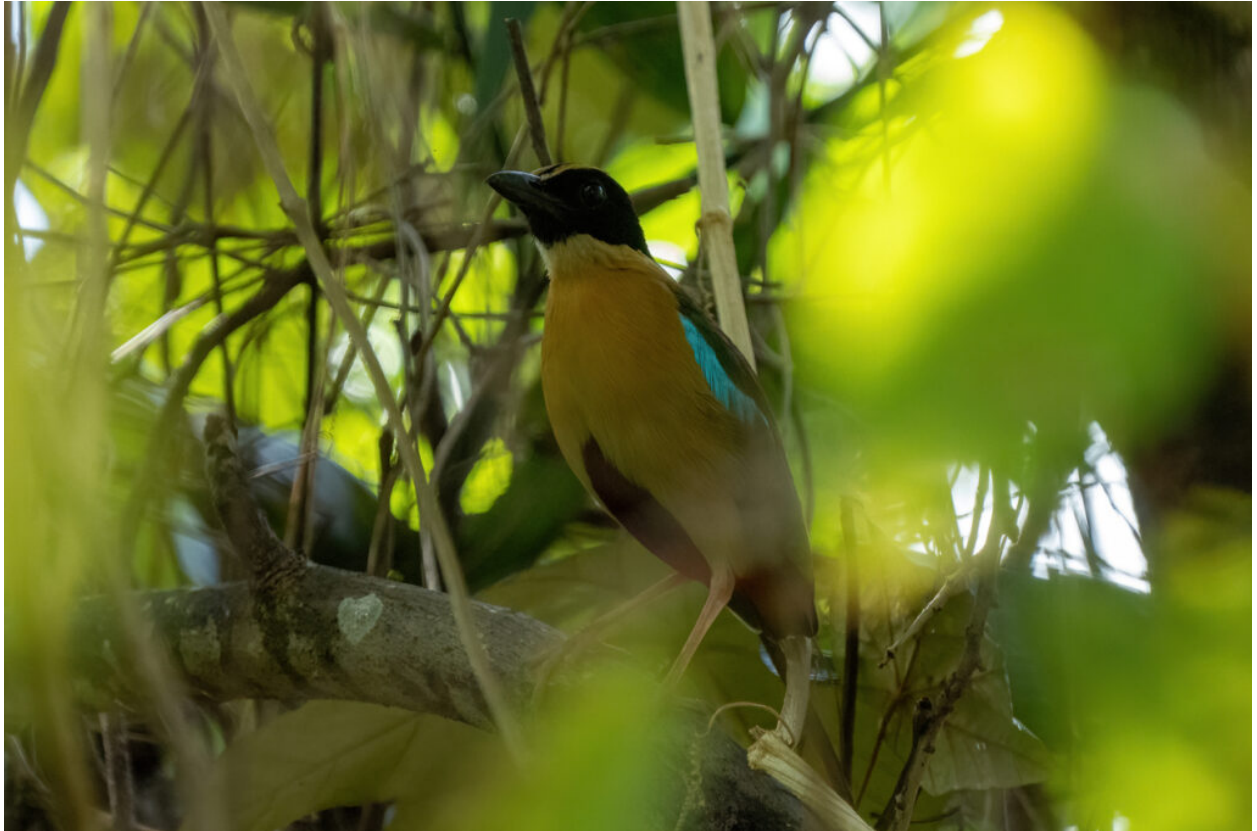
The endemic virginalis form of the (Wallace's) Elegant Pitta