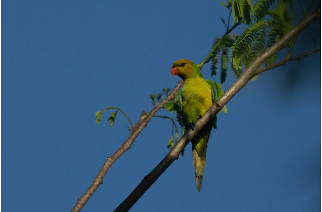
Olive-headed Lorikeet