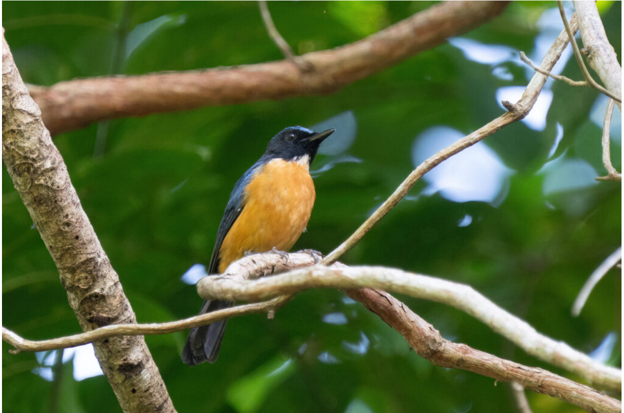
The endemic Tanahjampea Blue Flycatcher (or Tanahjampea Jungle Flycatcher)