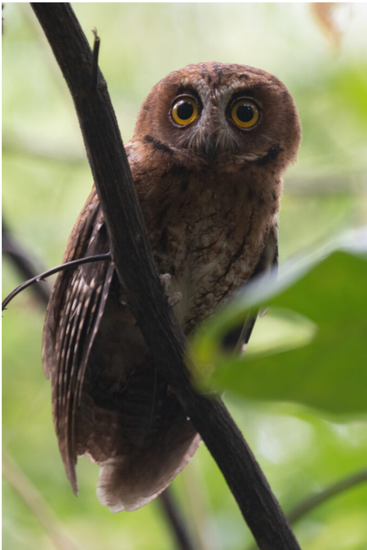
The endemic Wetar Scops Owl, a real star!