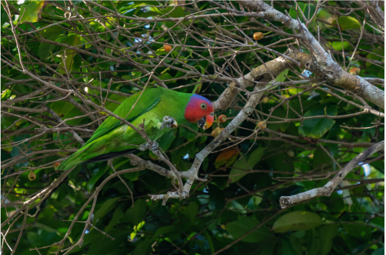
Red-cheeked Parrot of the form timorlaoensis in Tanimbar