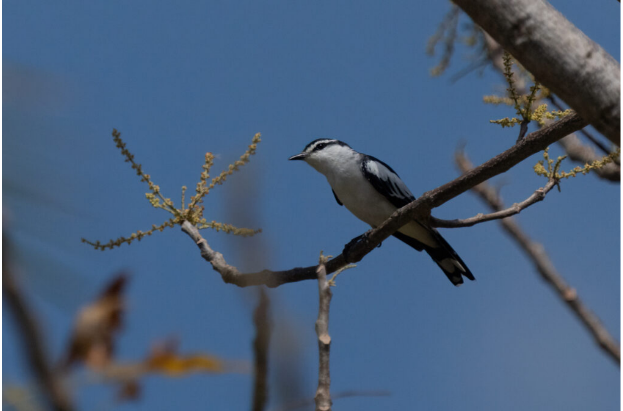
White-shouldered (or Lesueur's) Triller