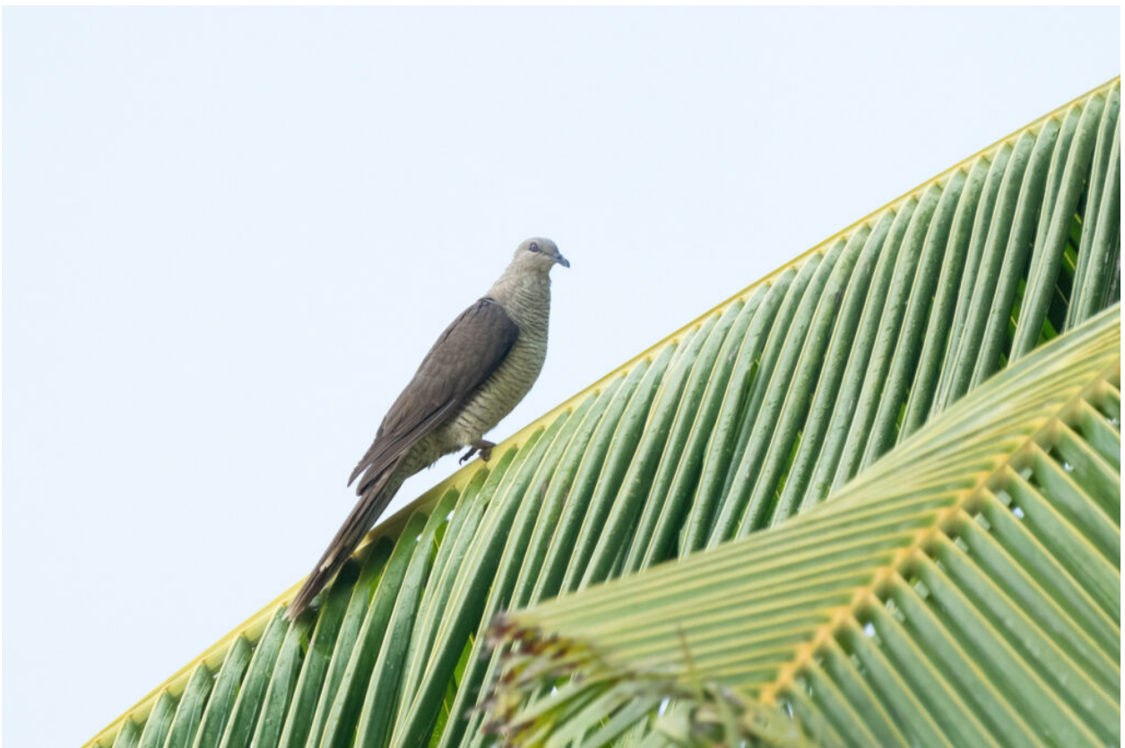
The endemic Flores Sea Cuckoo-Dove