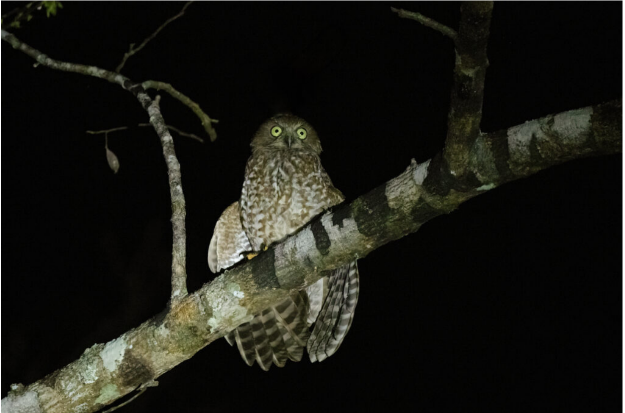
The endemic Alor Boobook