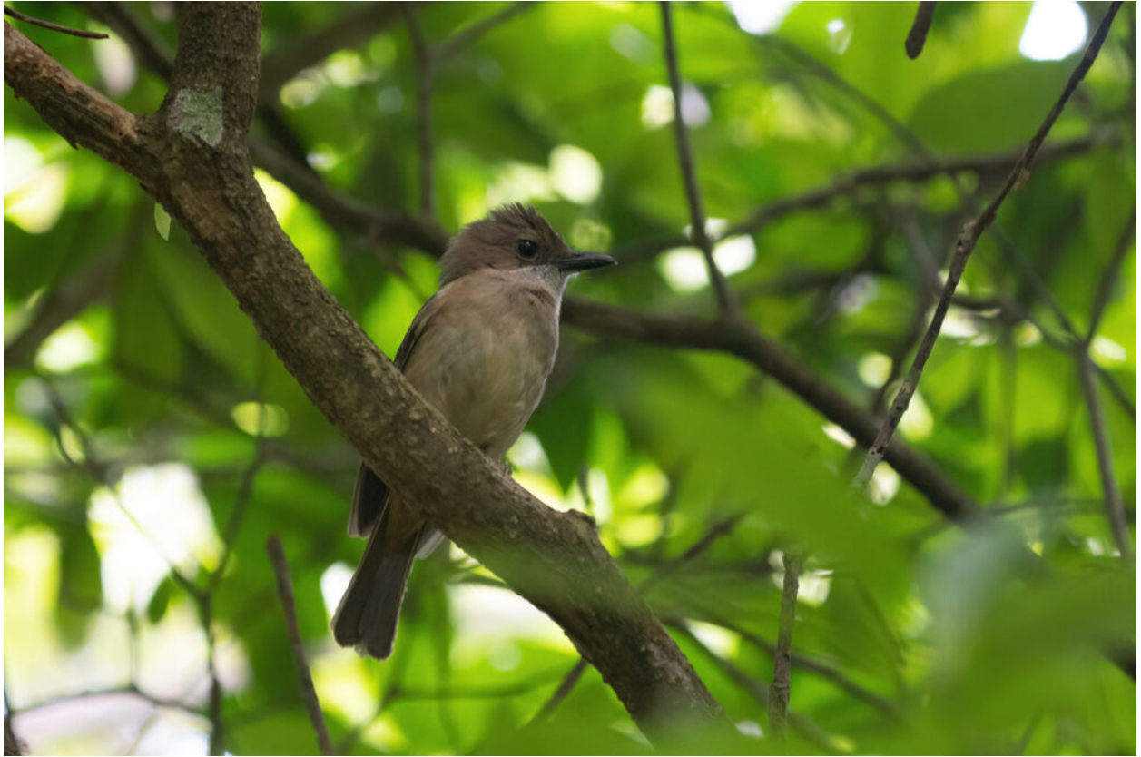
A female 'Damar Whistler'