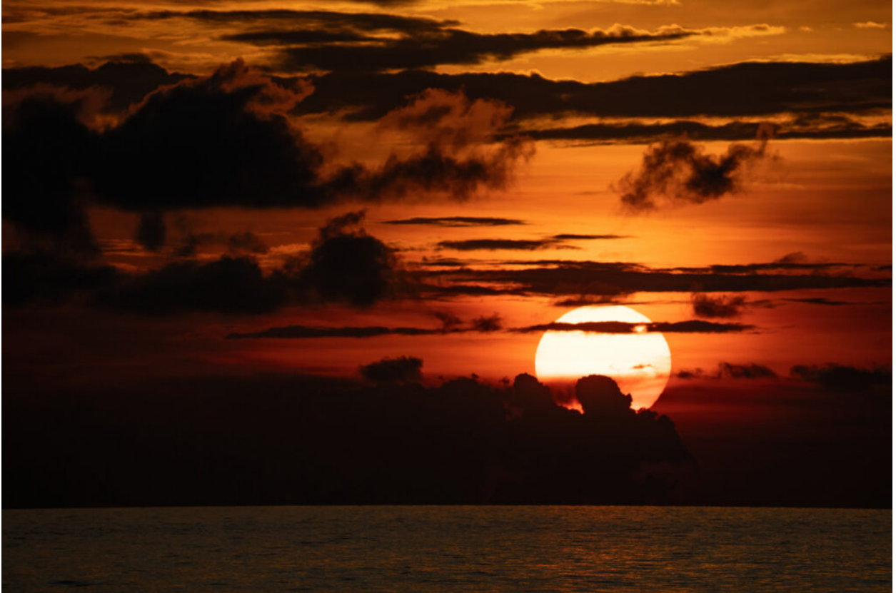
Yet another Banda Sea sunset