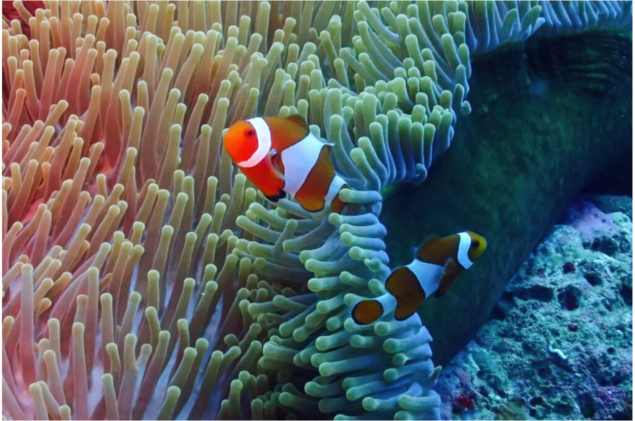
Orange Clownfish in their anemone home