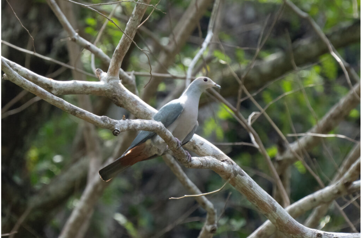
Pink-headed Imperial Pigeon