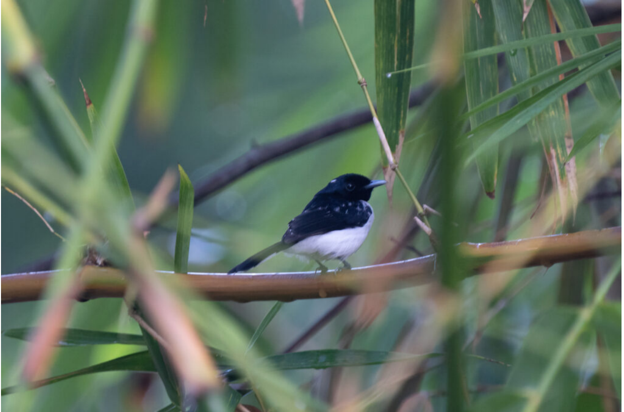
The endemic Tanahjampea Monarch