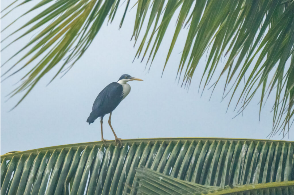
Pied Heron