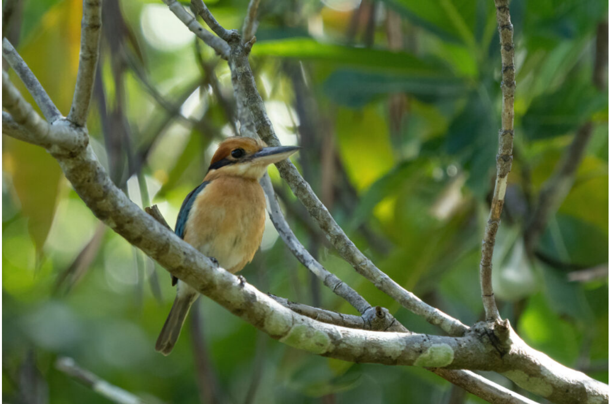
Cinnamon-banded Kingfisher of the form dammerianus