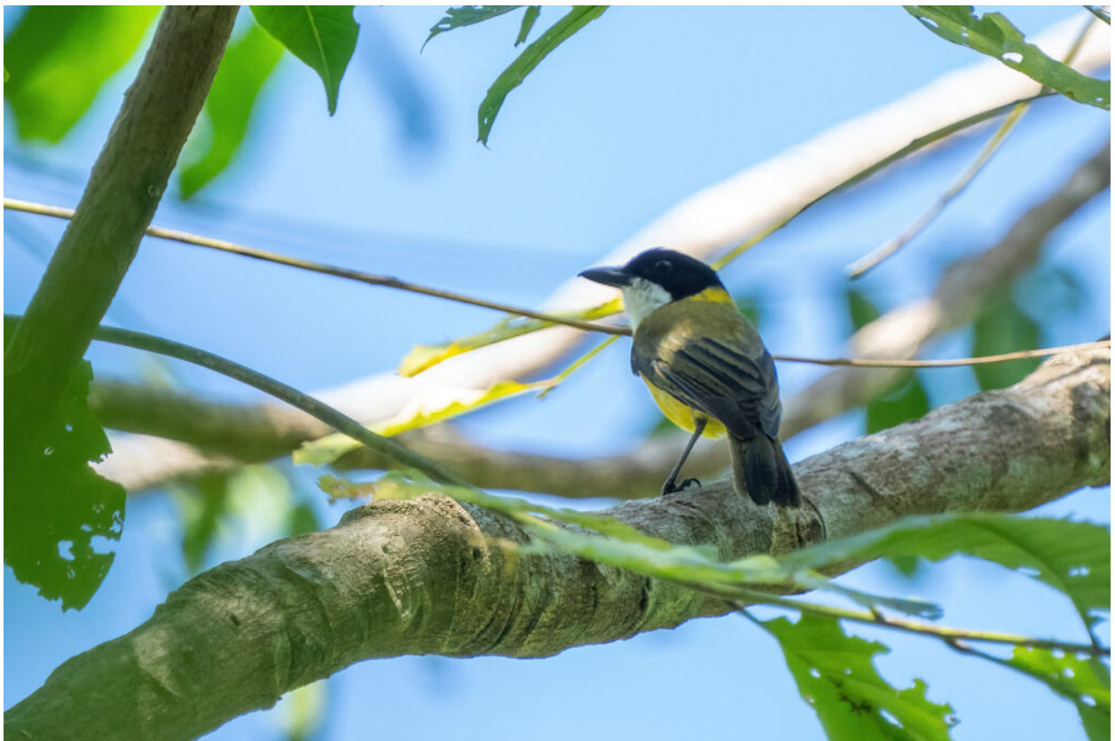
The endemic Babar Whistler