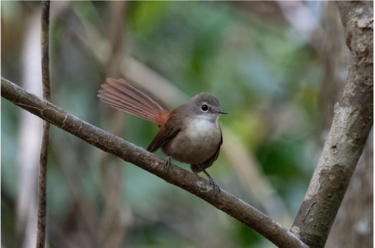
The endemic Long-tailed (or Charming) Fantail in Tanimbar