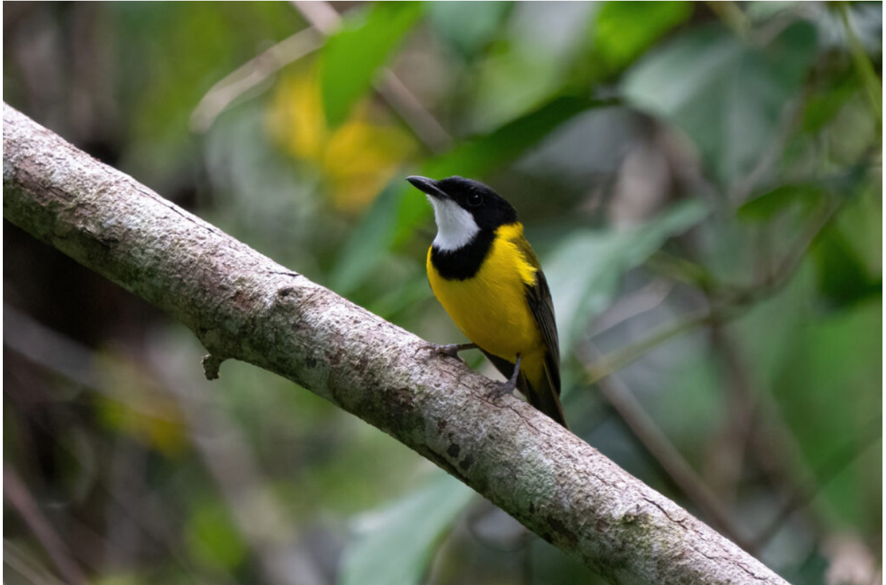
The endemic 'Damar Whistler' a likely split from Golden Whistler