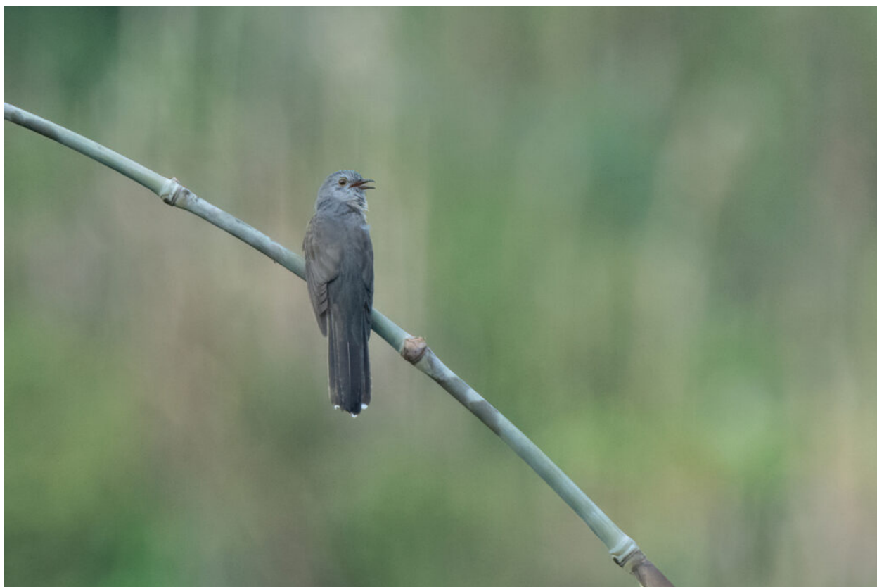
Rusty-breasted Cuckoo