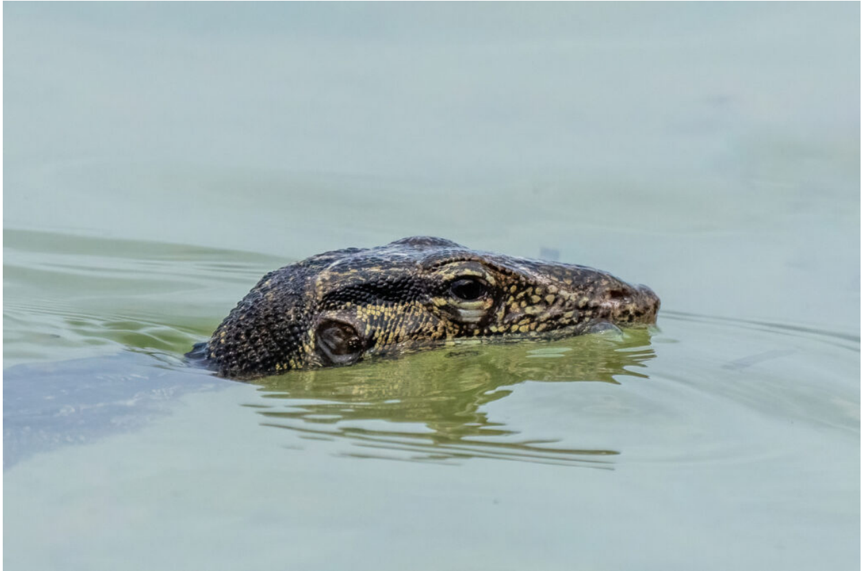
Asian Water Monitor