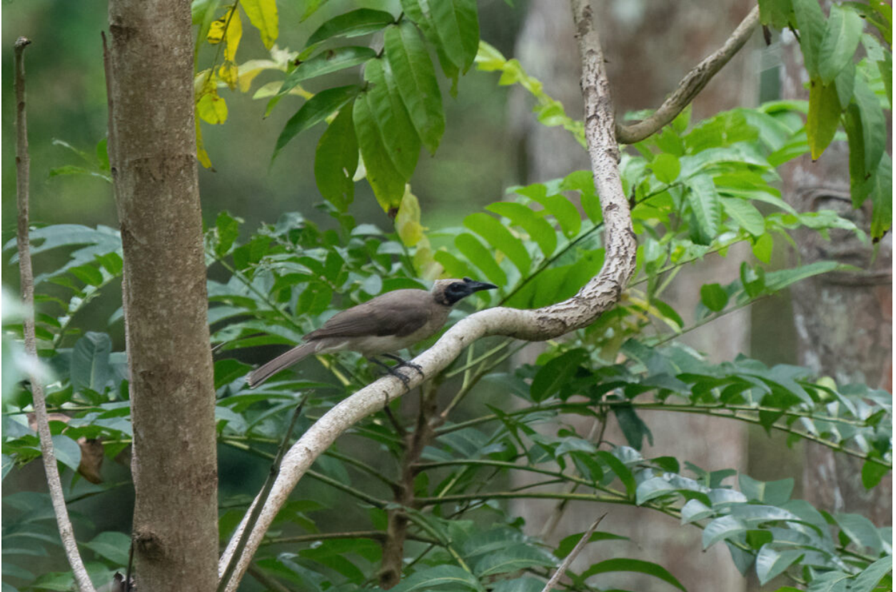
Tenggara Friarbird on Alor