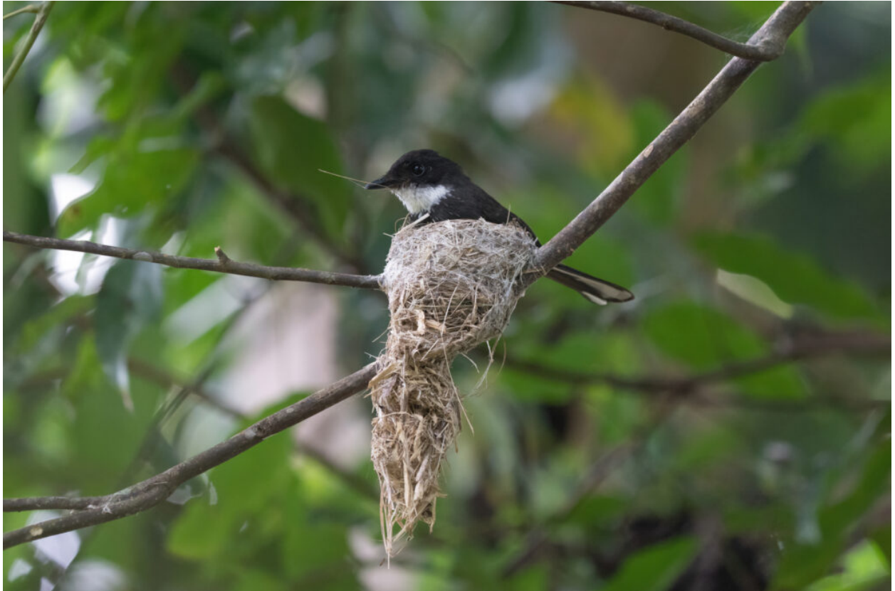
The endemic Banda Sea Fantail