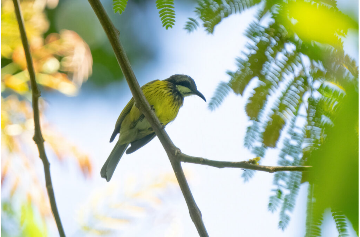
The endemic Black-necked Honeyeater