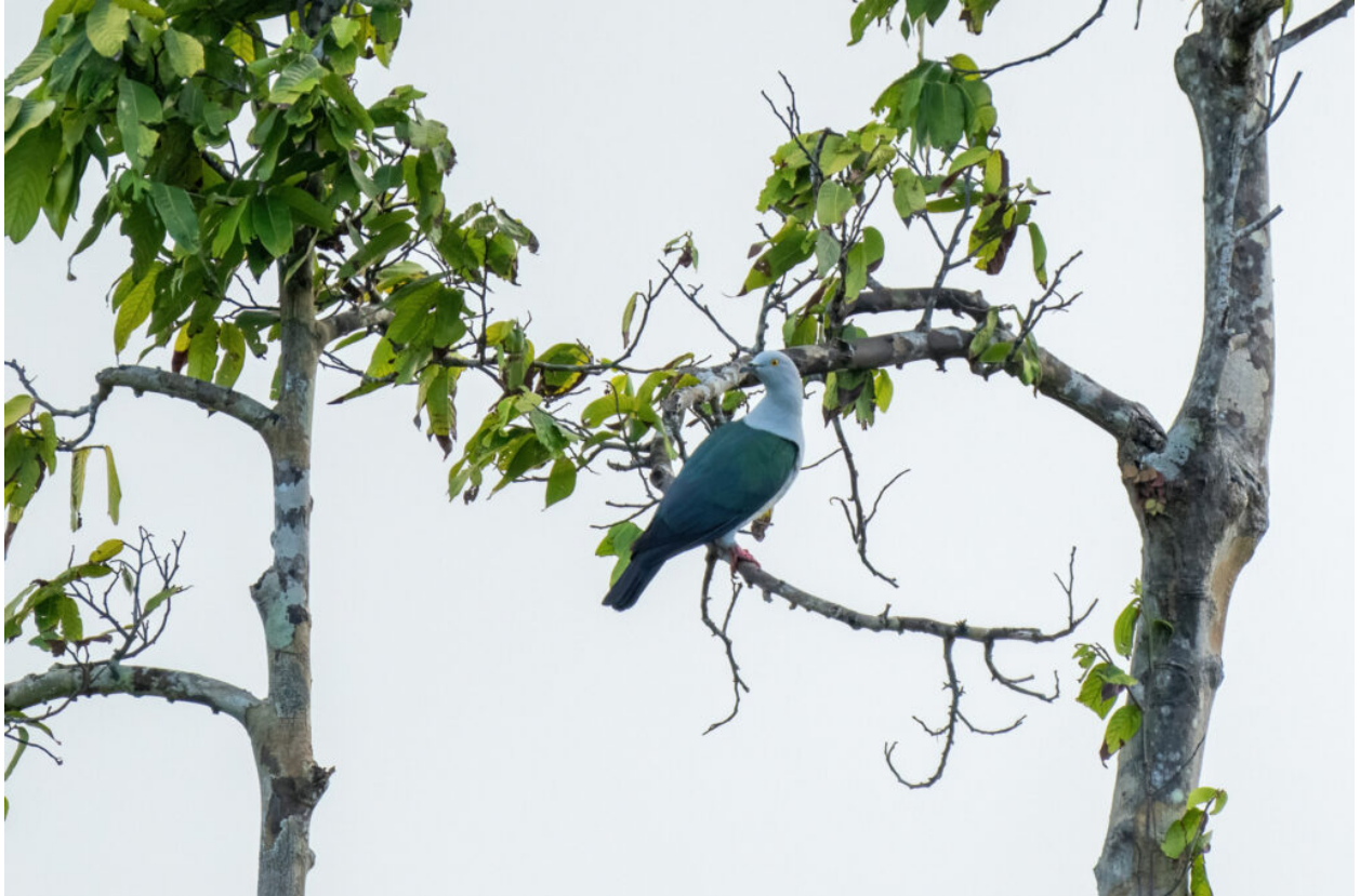
Elegant Imperial Pigeon