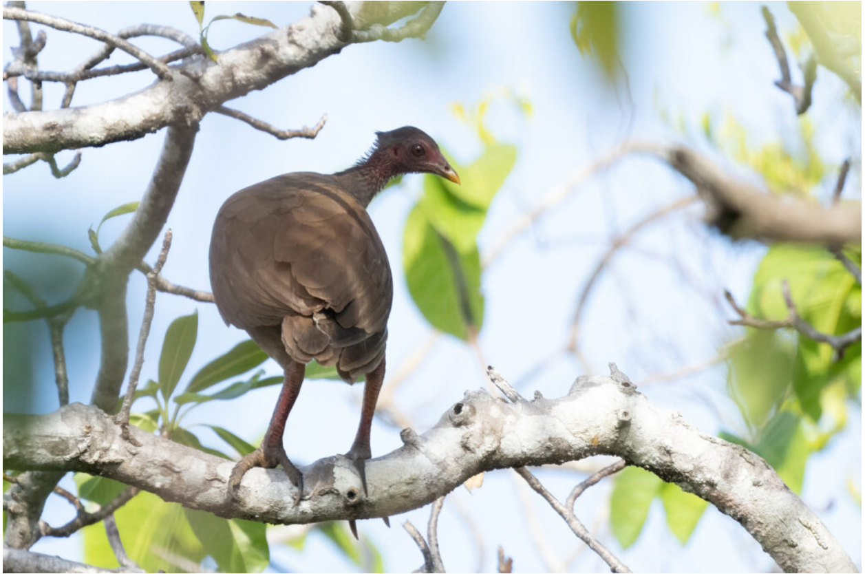
Tanimbar Megapode (or Tanimbar Scrubfowl) is the most difficult of Tanimbar's endemics