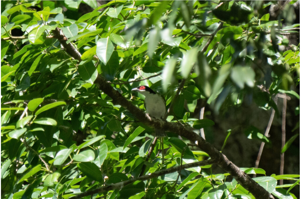
The endemic Wetar Figbird