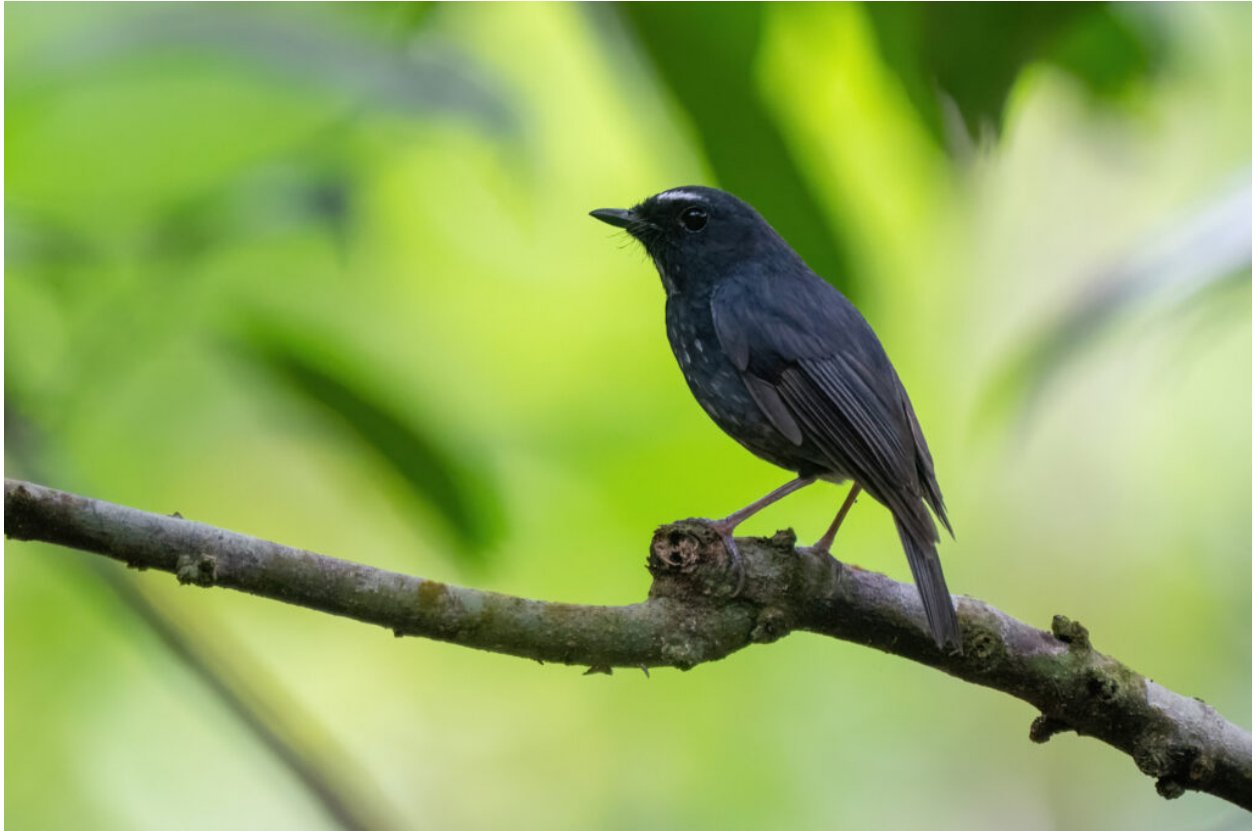
The delightful little endemic Damar Flycatcher, lost to science for a century