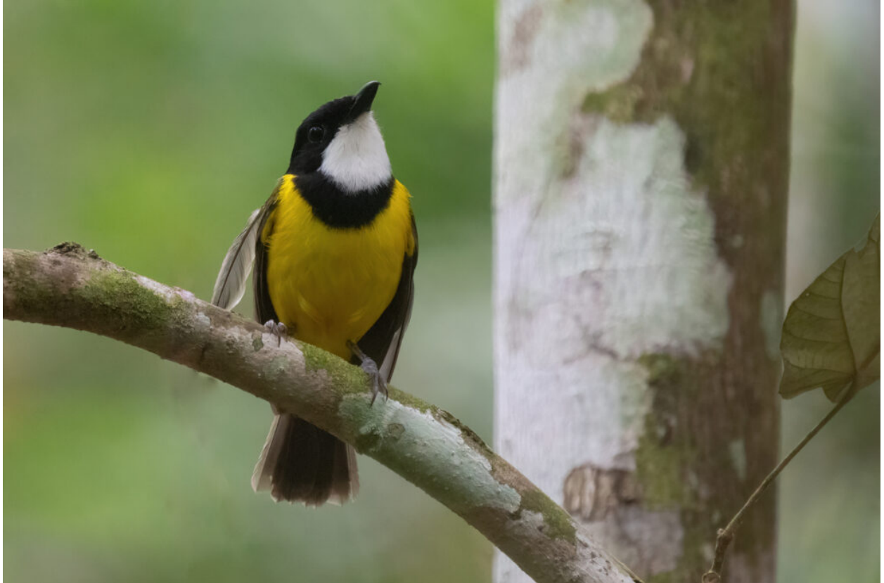
A male 'Damar Whistler'