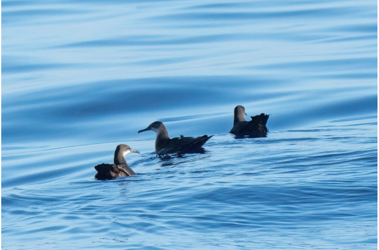
The rare and little-known Heinroth's Shearwater