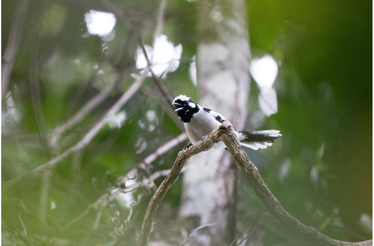
The perky endemic Tanimbar Monarch