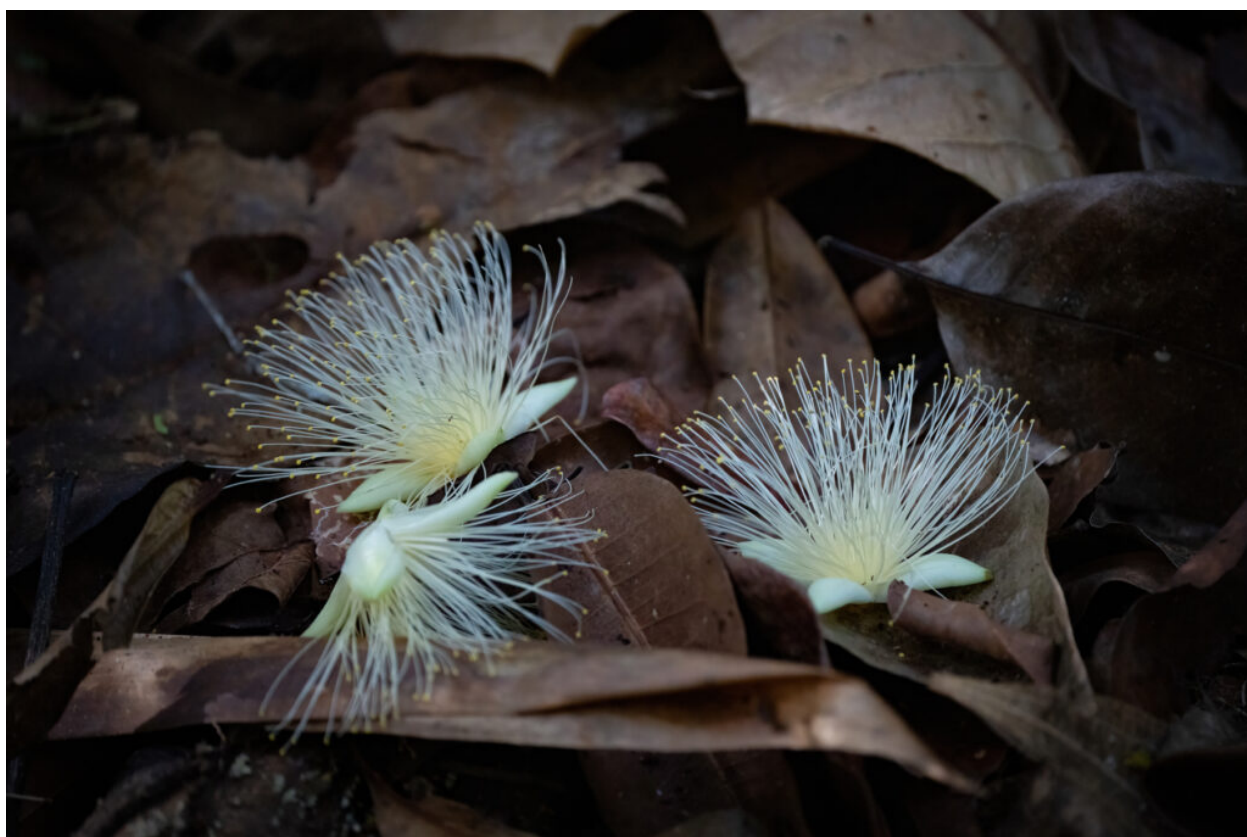
Malabar Plum flowers, beloved of myzomelas and honeyeaters