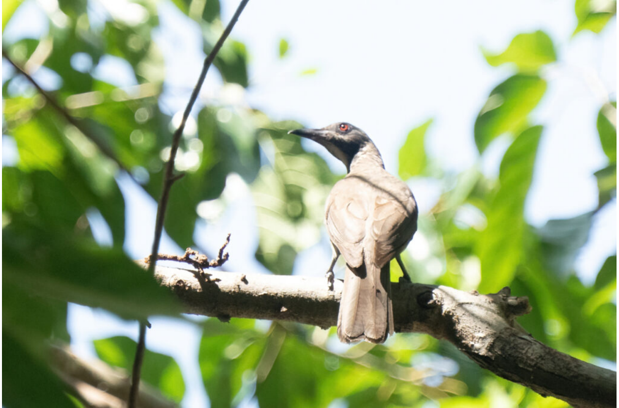
The endemic Wetar Oriole