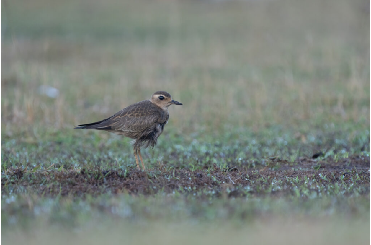
An Oriental Plover pauses on migration to Australia