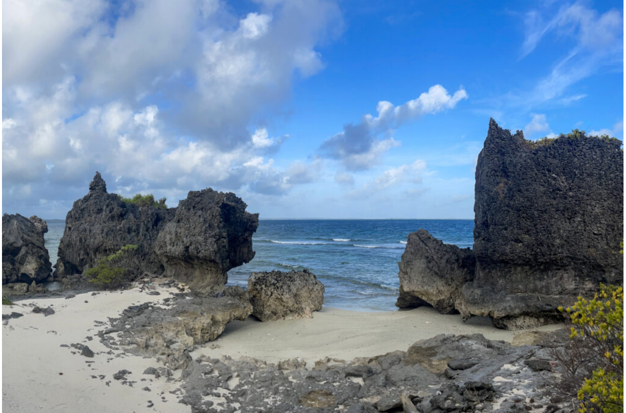
Eroded uplifted coral in the Banda Sea