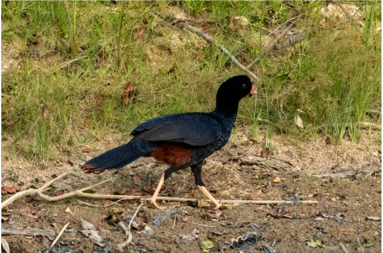
Crestless Curassow (image by Eustace Barnes)