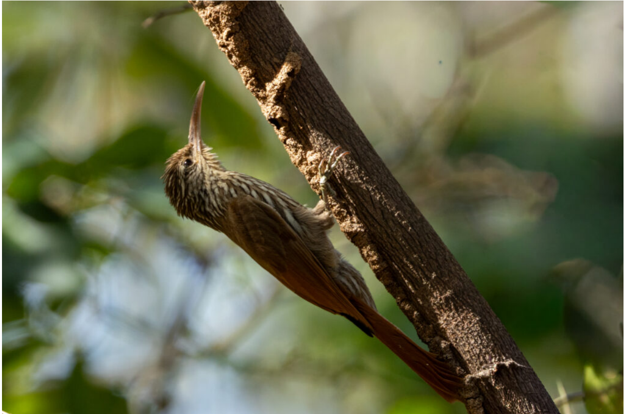
Streak-headed Woodcreeper