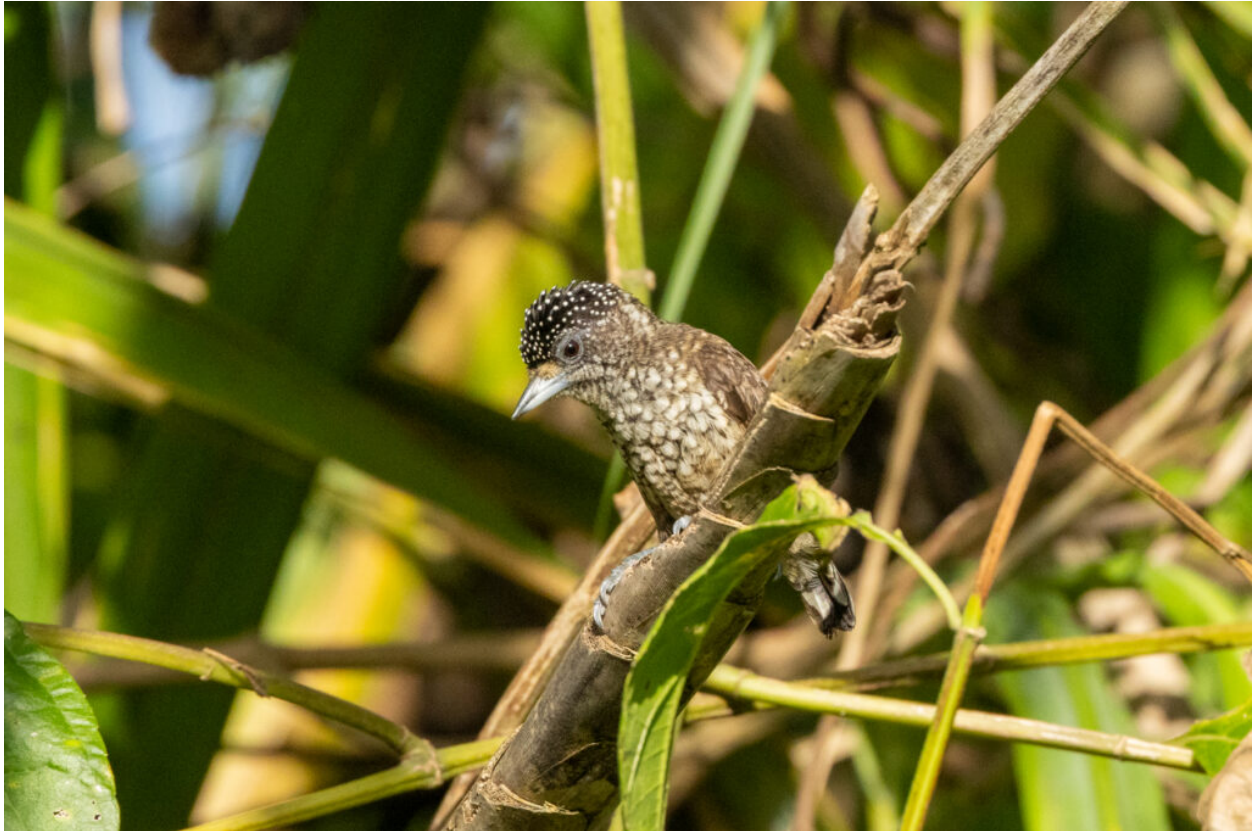
Arrowhead Piculet (image by Eustace Barnes)