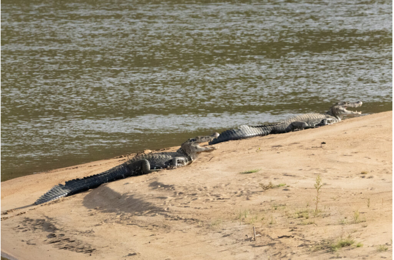
Spectacled Caimans