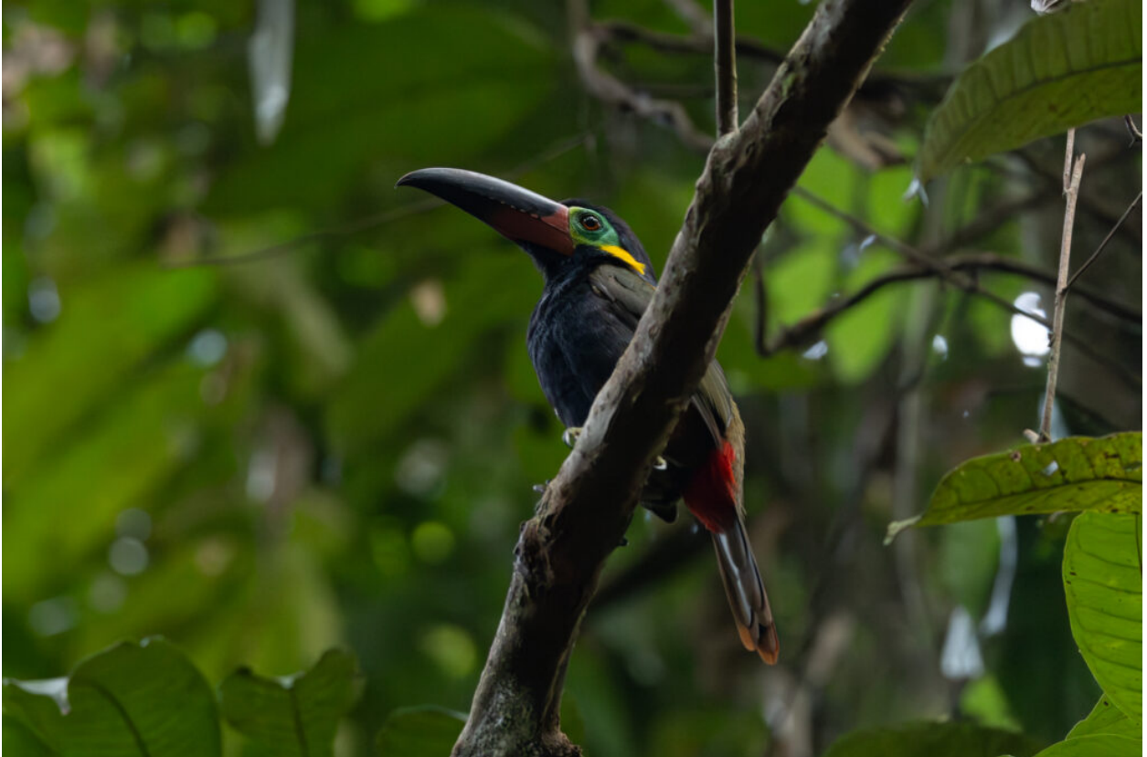
Guianan Toucanet