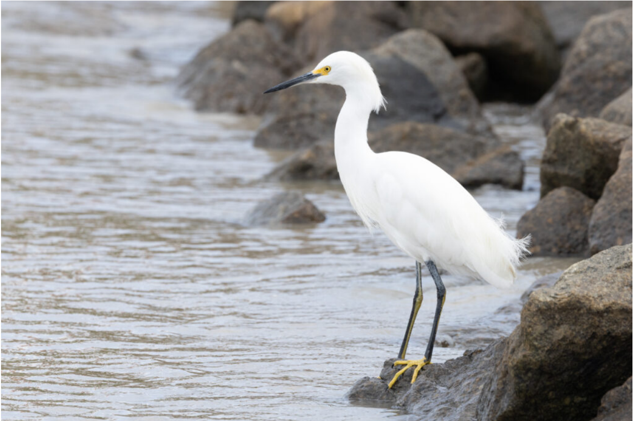
Snowy Egret