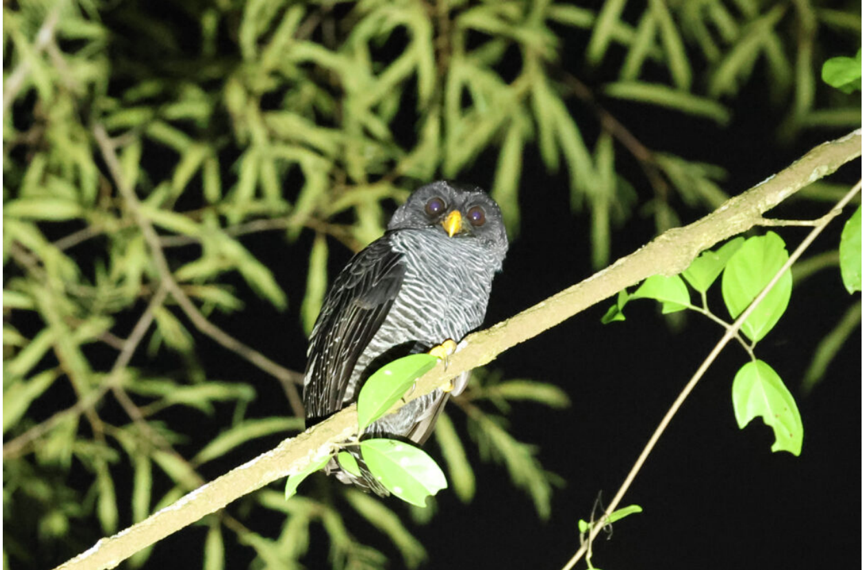
Black-banded Owl