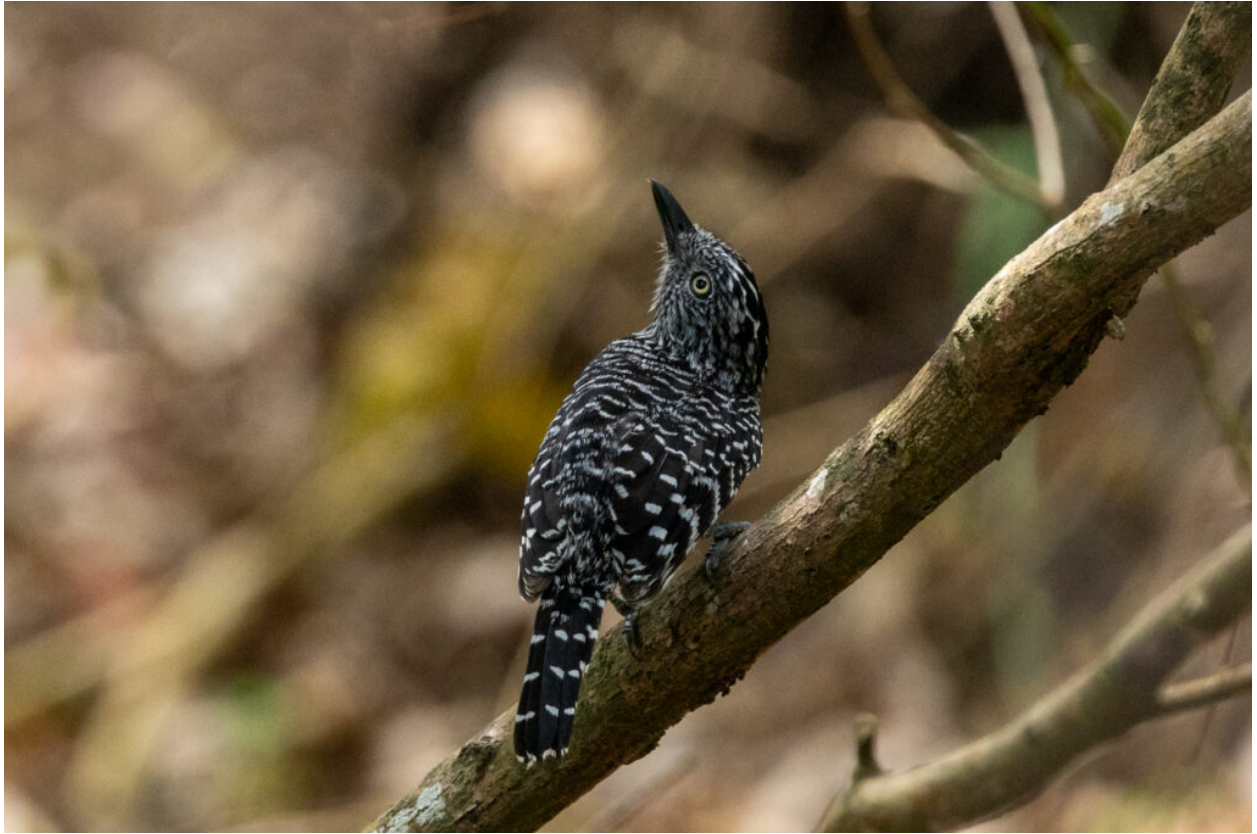
Barred Antshrike