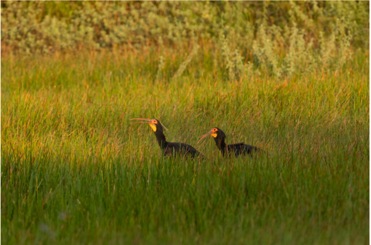
Sharp Tailed Ibises