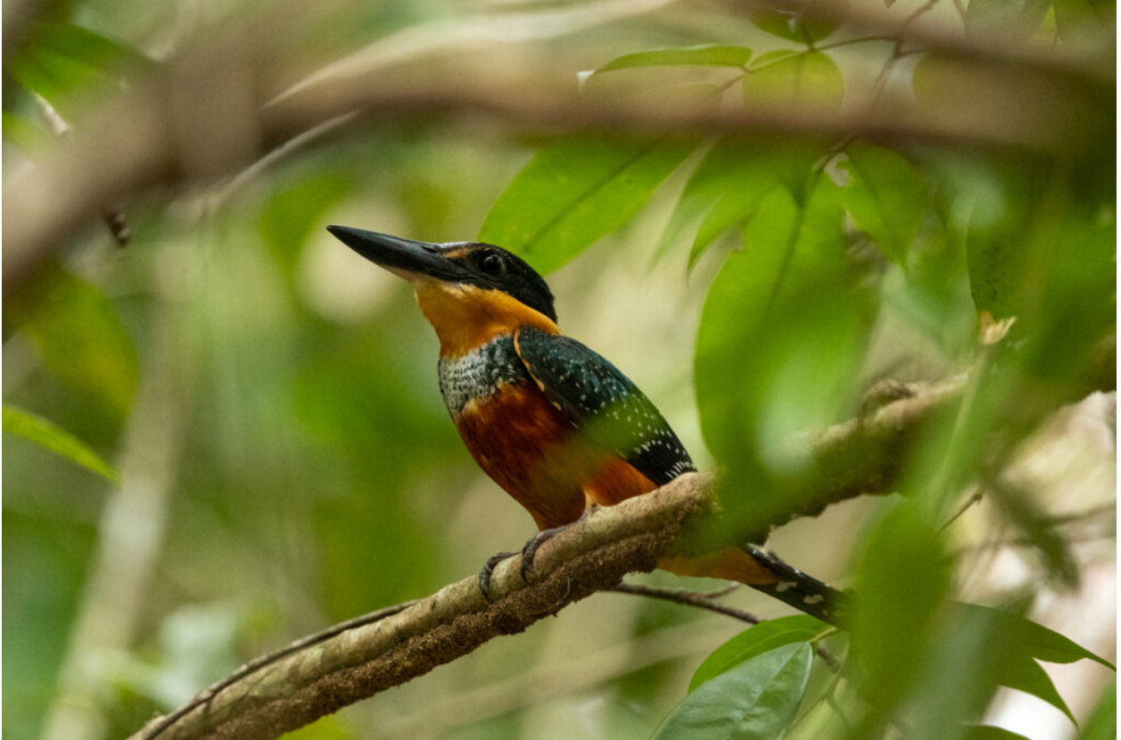
Green-and-Rufous Kingfisher