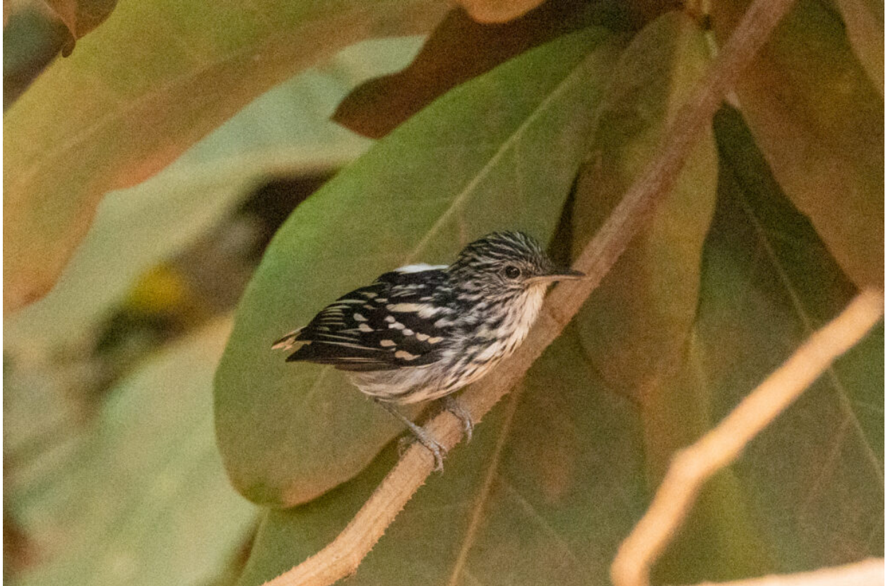
Guianan Streaked Antwren (image by Eustace Barnes)