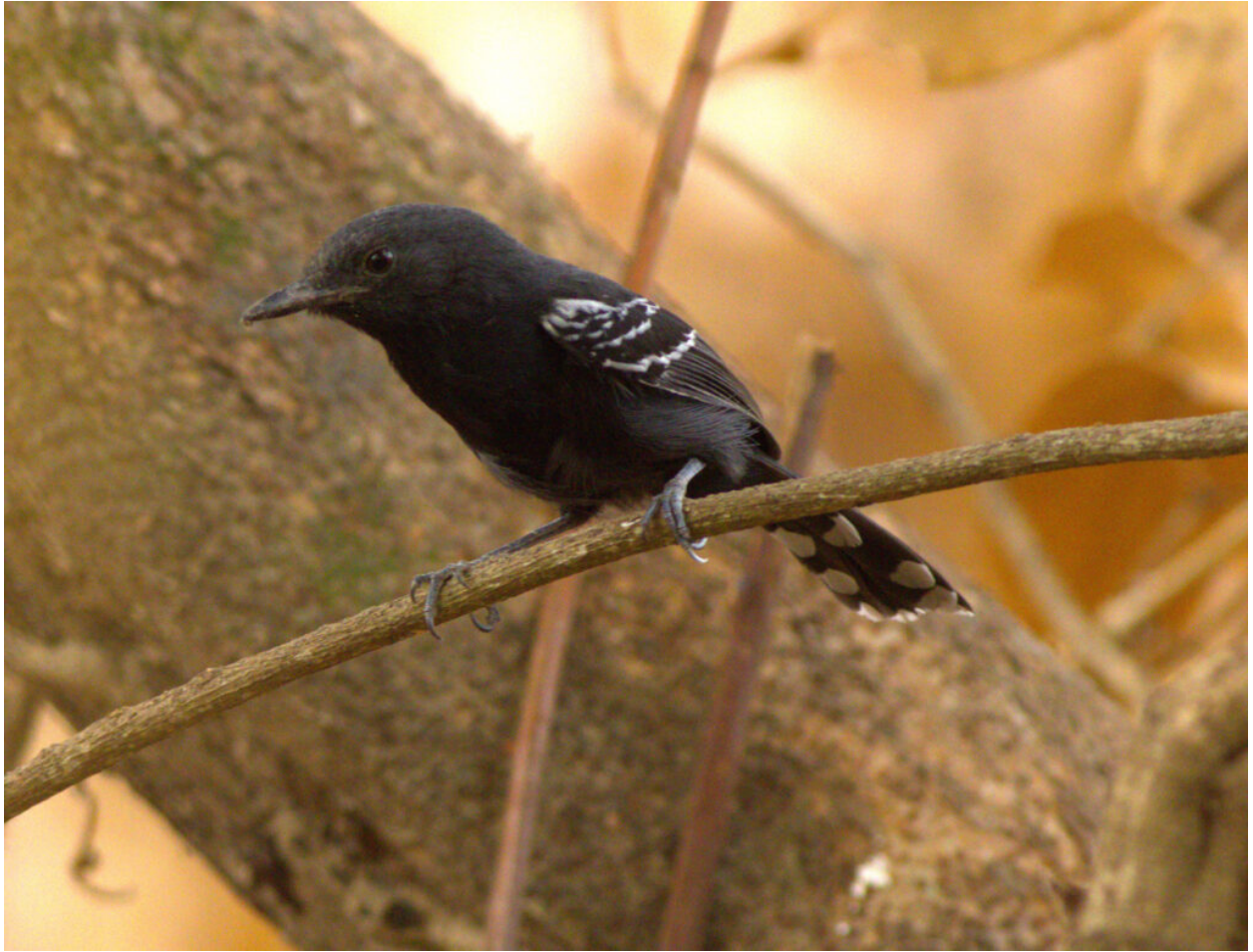
Rio Branco Antbird