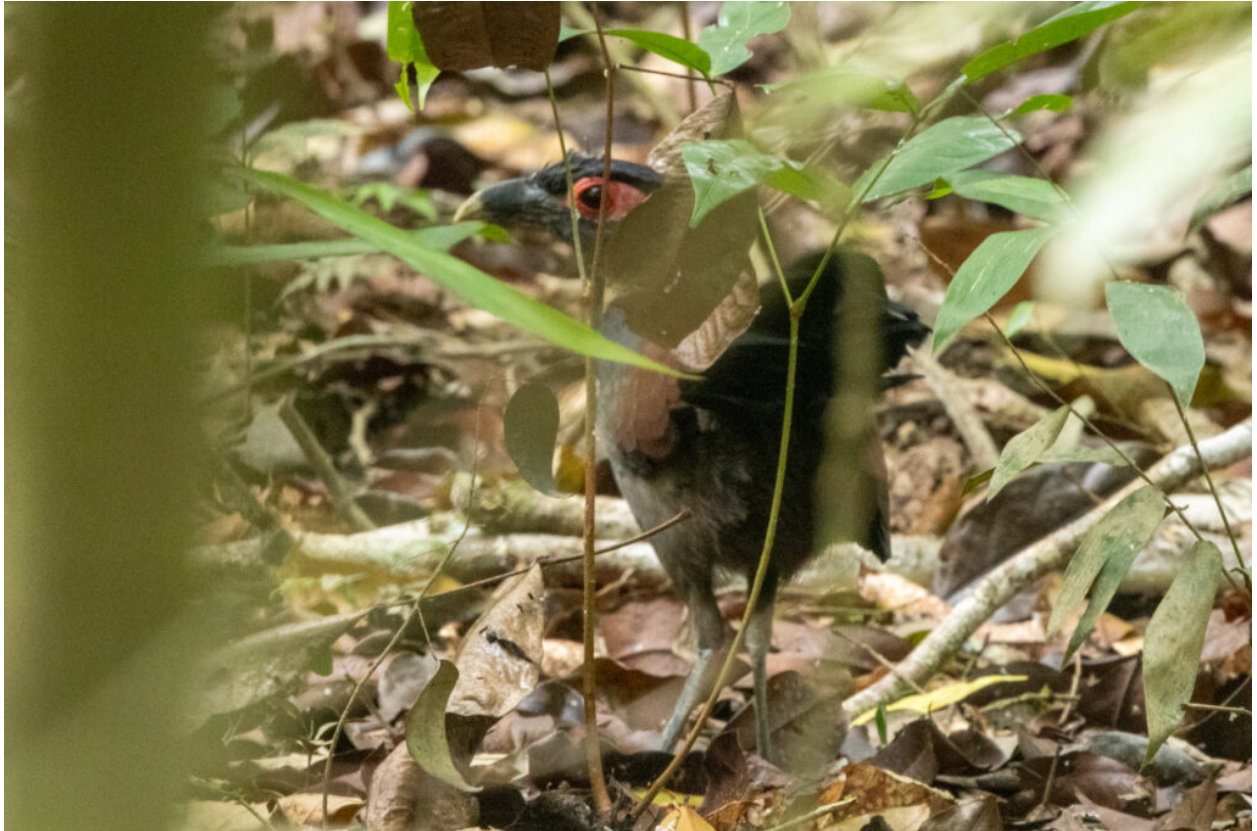
Rufous-winged Ground-Cuckoo