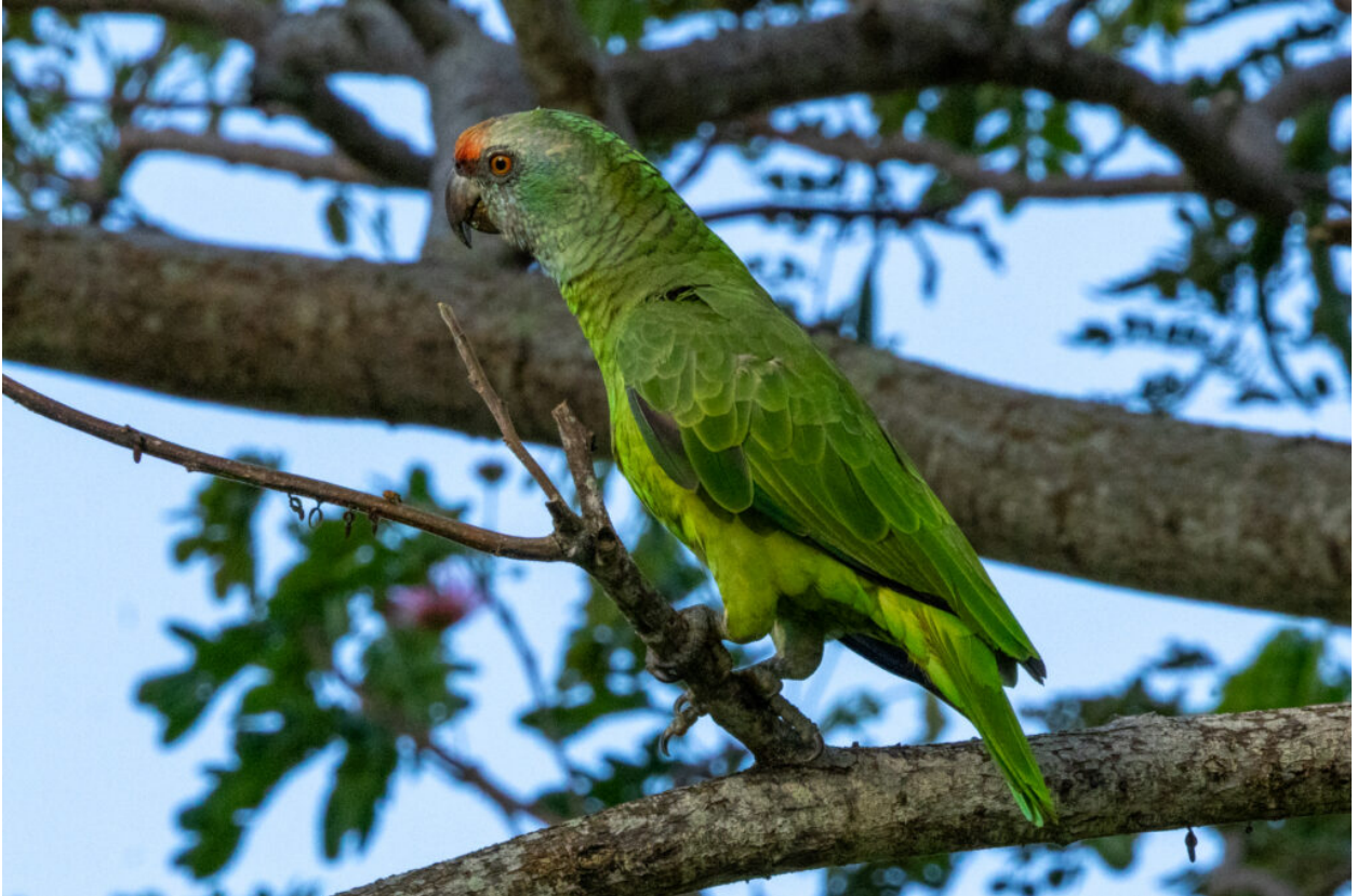
Festive Amazon