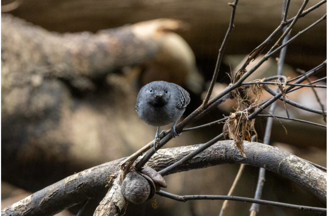
Black-chinned Antbird