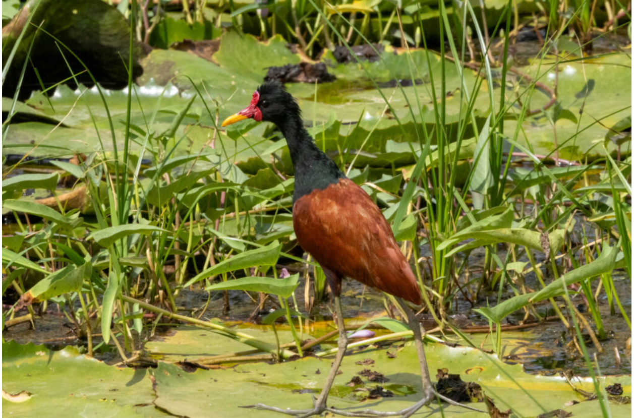
Wattled Jacana (image by Eustace Barnes)