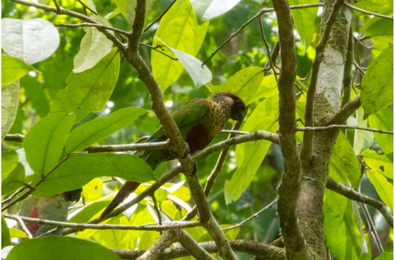
Painted Parakeet