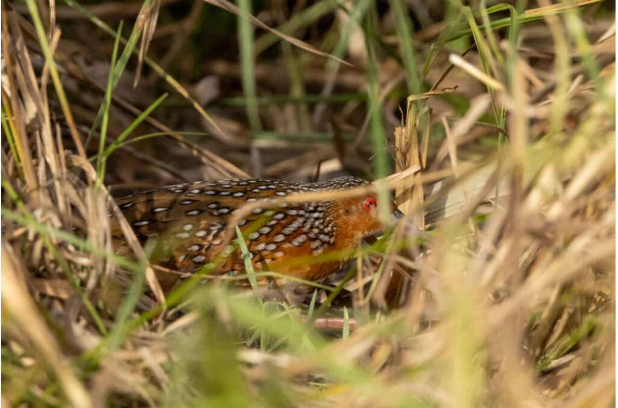
Ocellated Crane