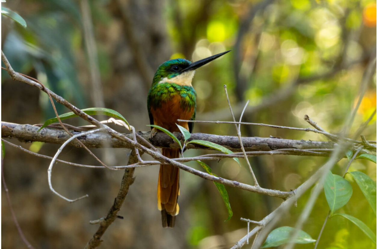
Rufous-tailed Jacamar