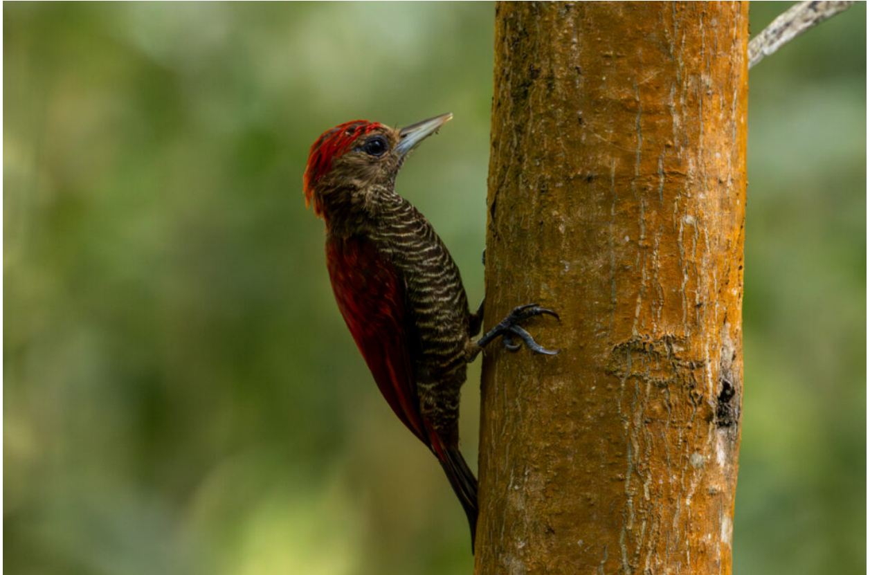
Blood-coloured Woodpecker