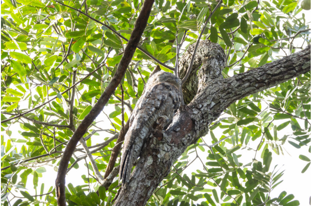
Great Potoo