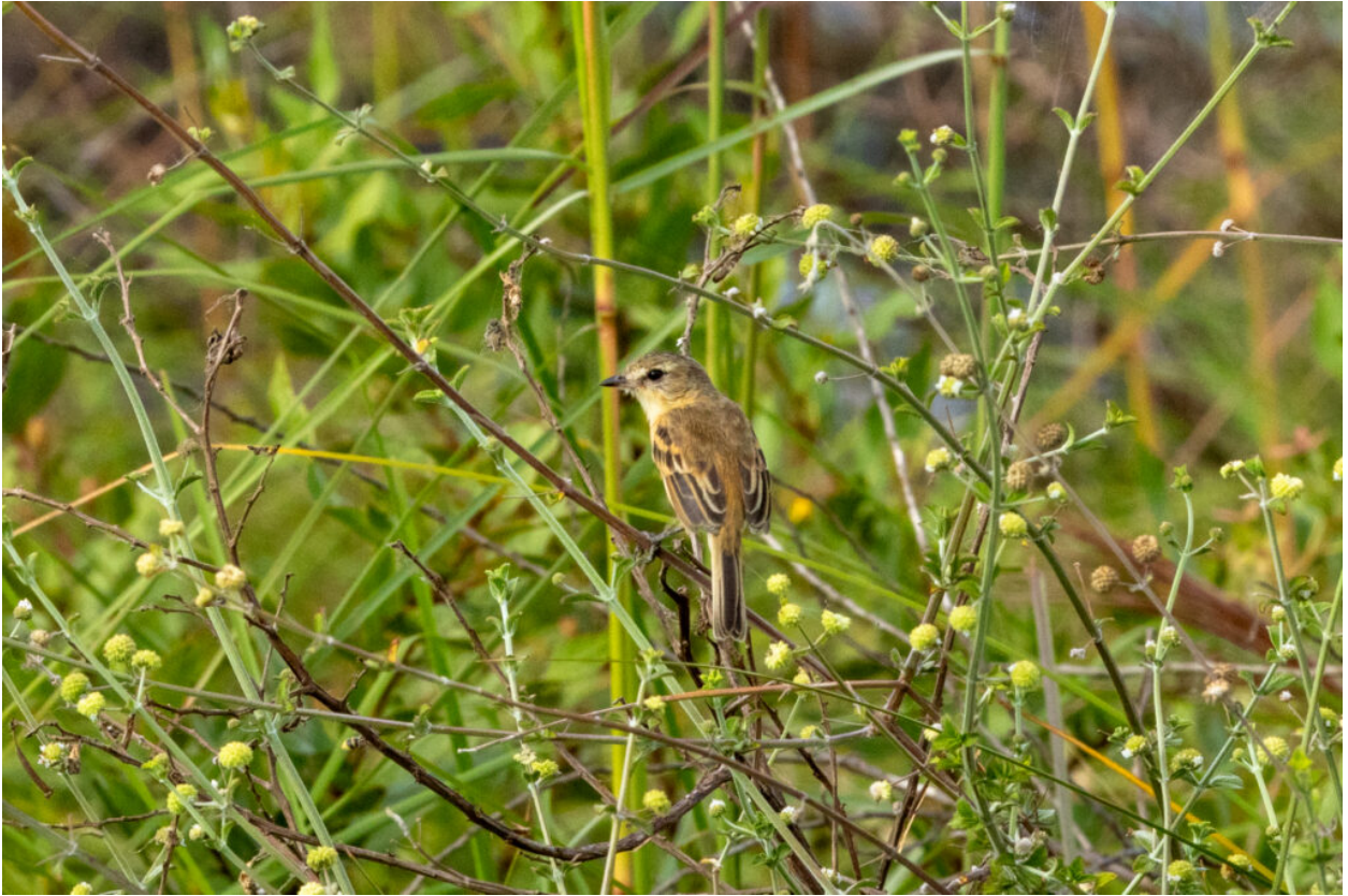
Bearded Tachuri