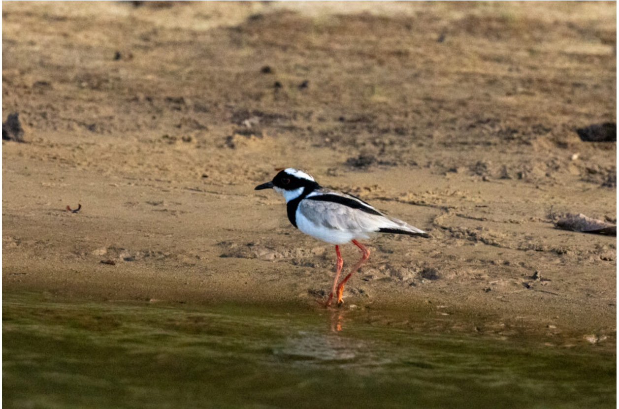
Pied Plover (image by Eustace Barnes)