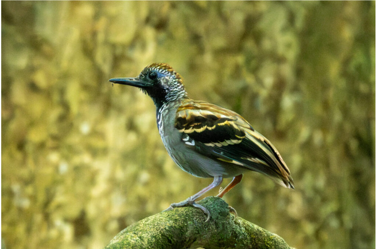
Wing-banded Antbird