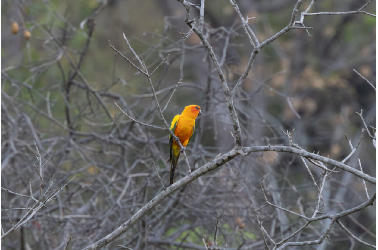
Sun Parakeet