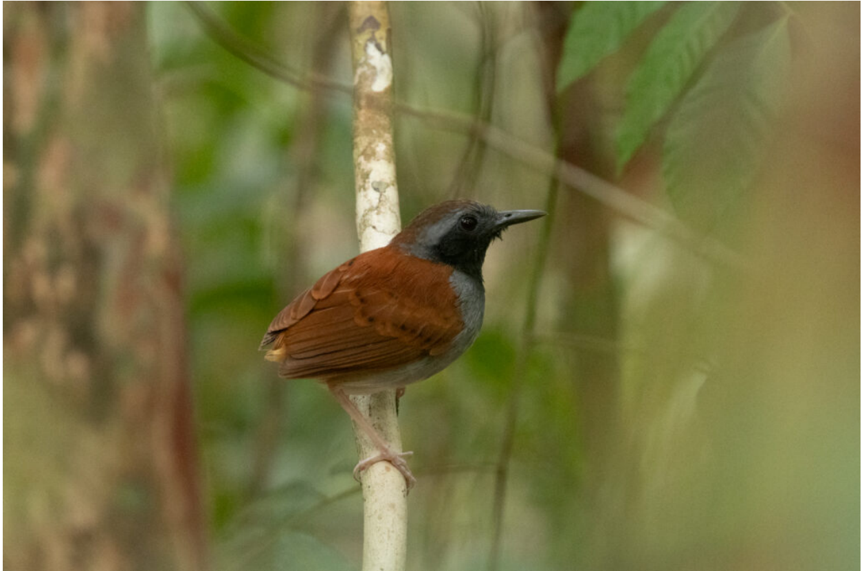
White-bellied Antbird