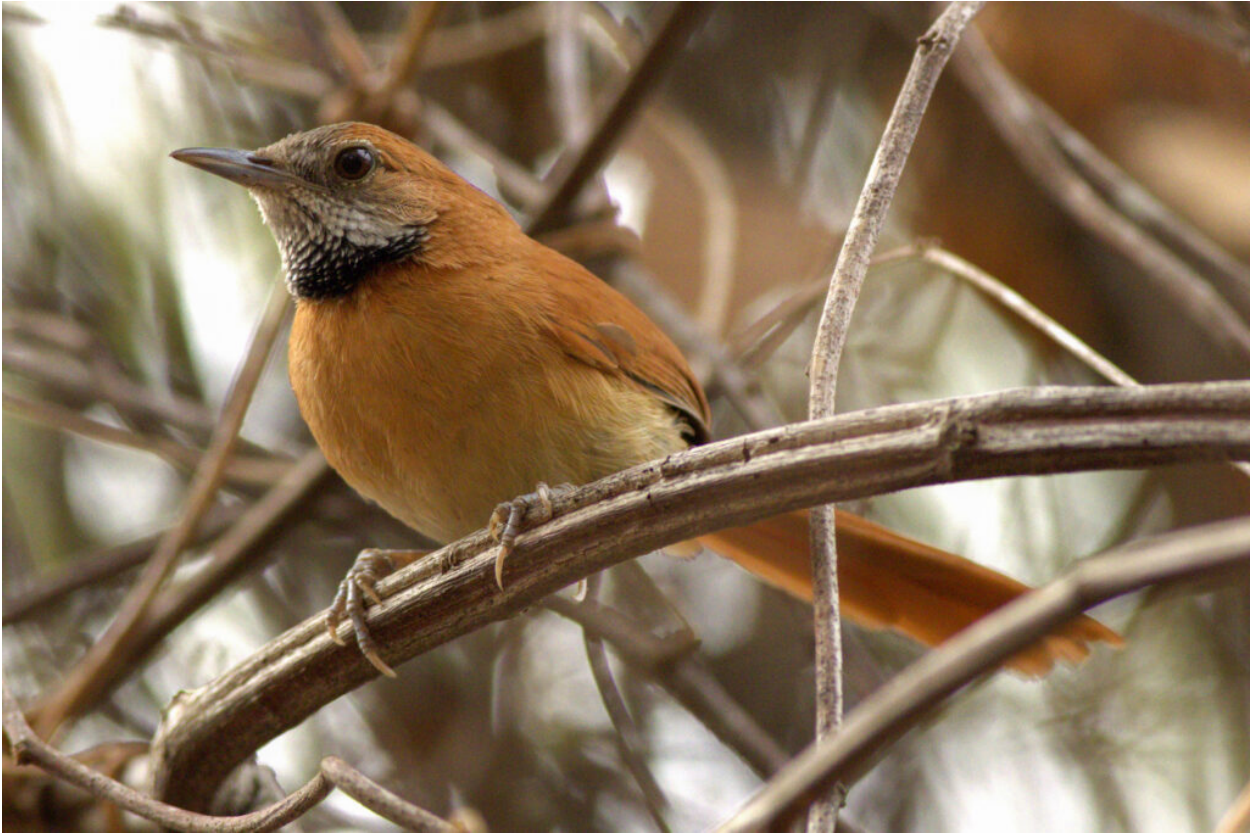
Hoary-throated Spinetail