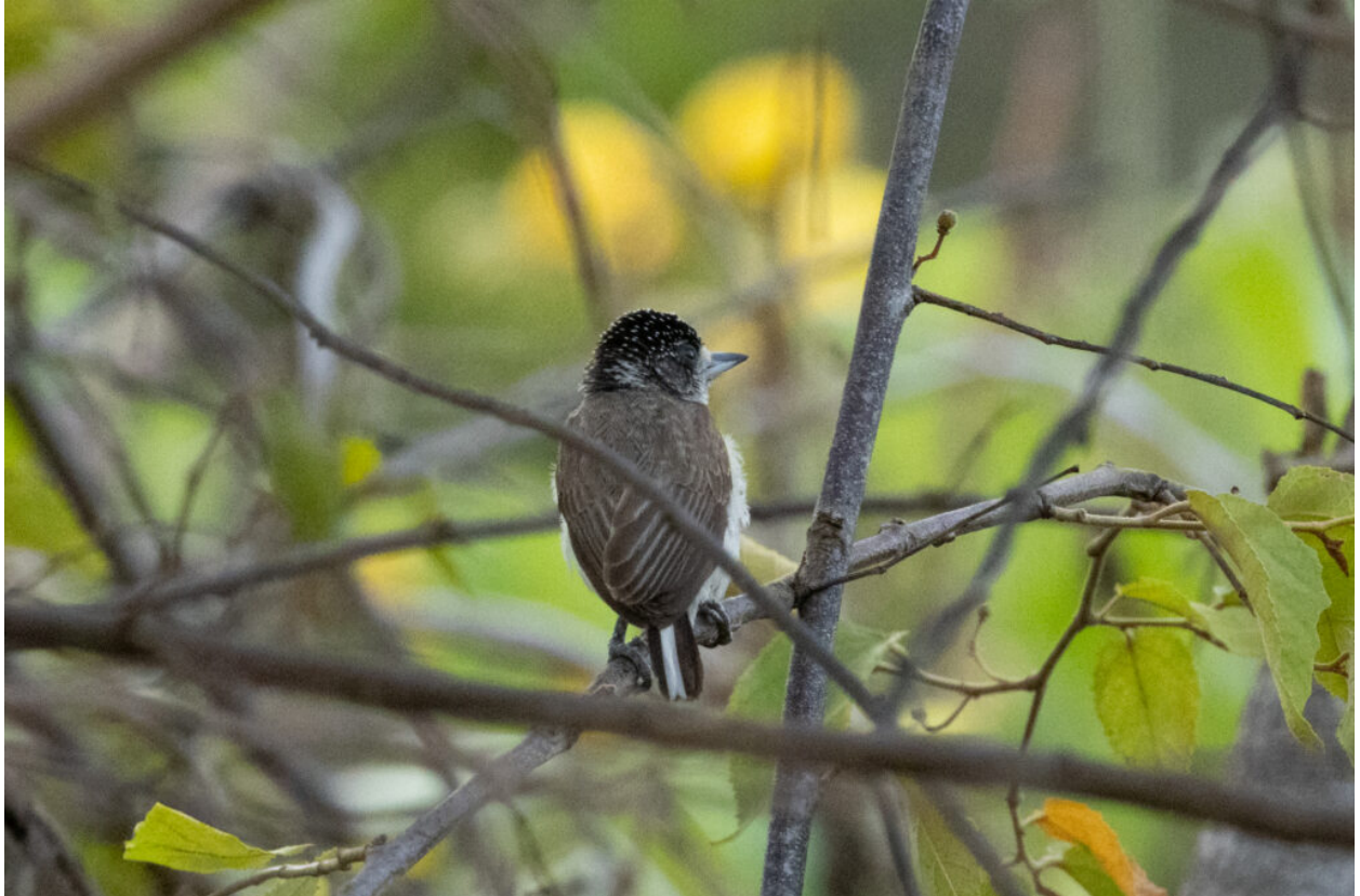
White-bellied Piculet