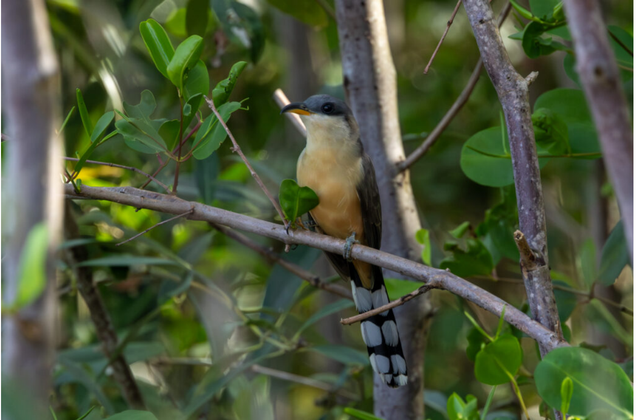
Mangrove Cuckoo