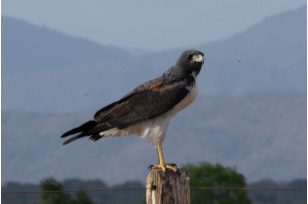
White-tailed Hawk