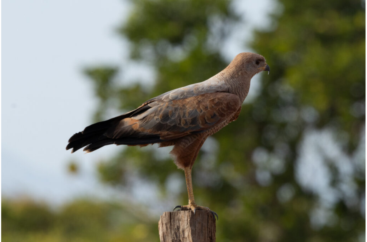
Savanna Hawk