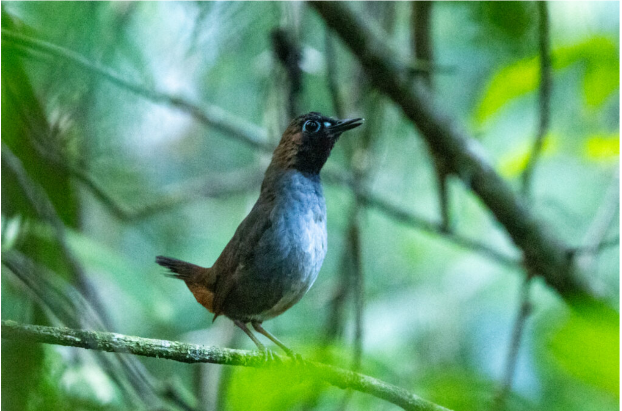
Black-faced Anthrush