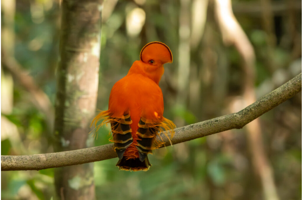
Guianan Cock-of-the-rock