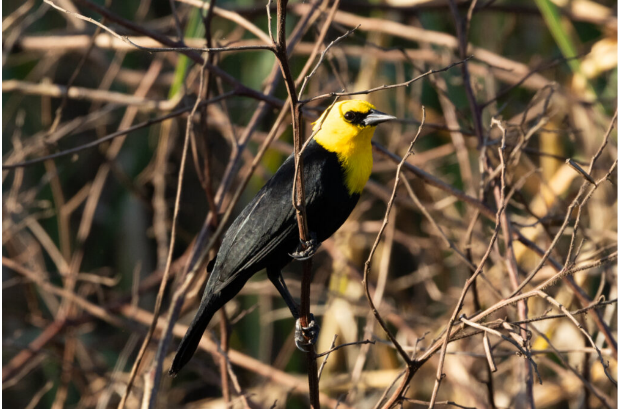
Yellow-hooded Blackbird