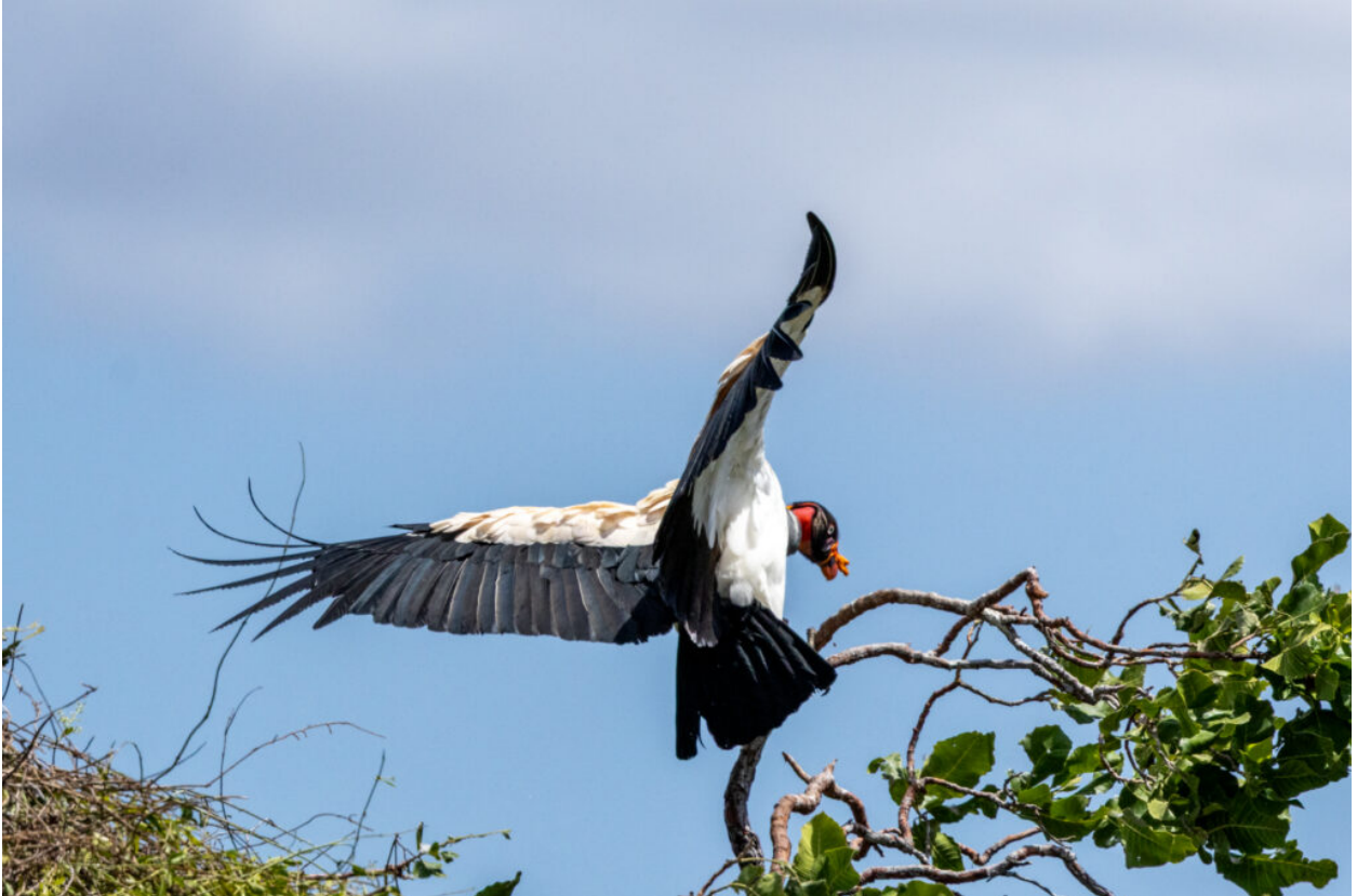
King Vulture