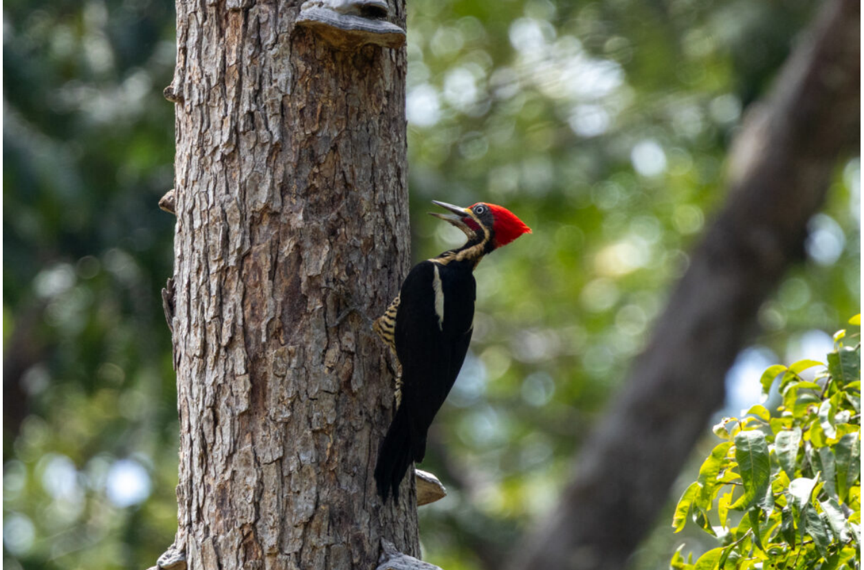
Lineated Woodpecker