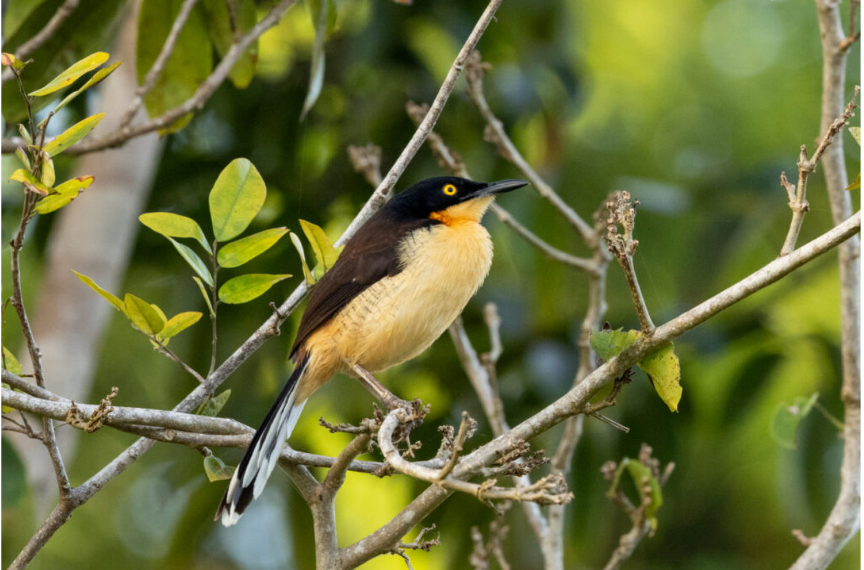
Black-capped Donacobius