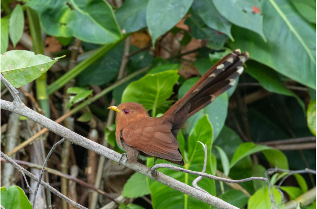
Little Cuckoo