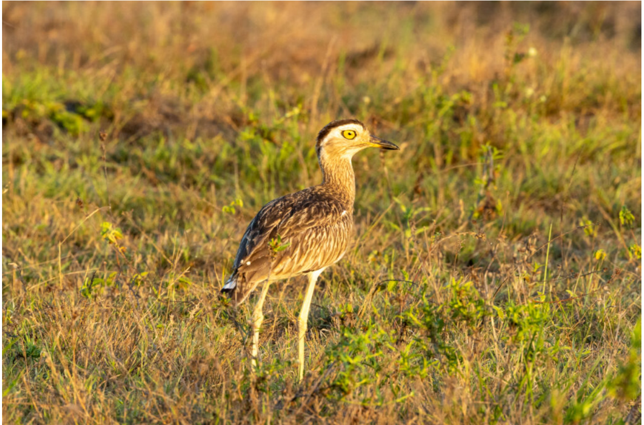
Double-striped Thick-knee