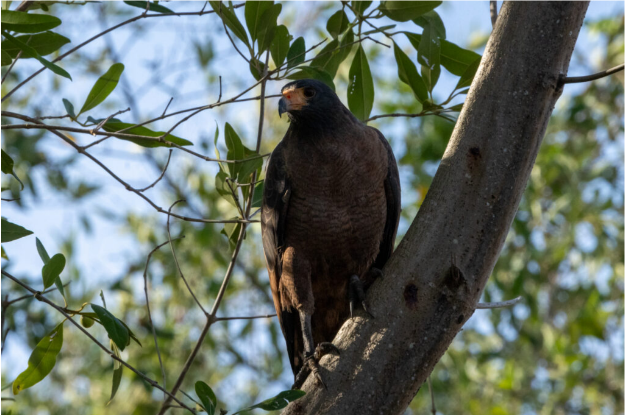
Rufous Crab Hawk