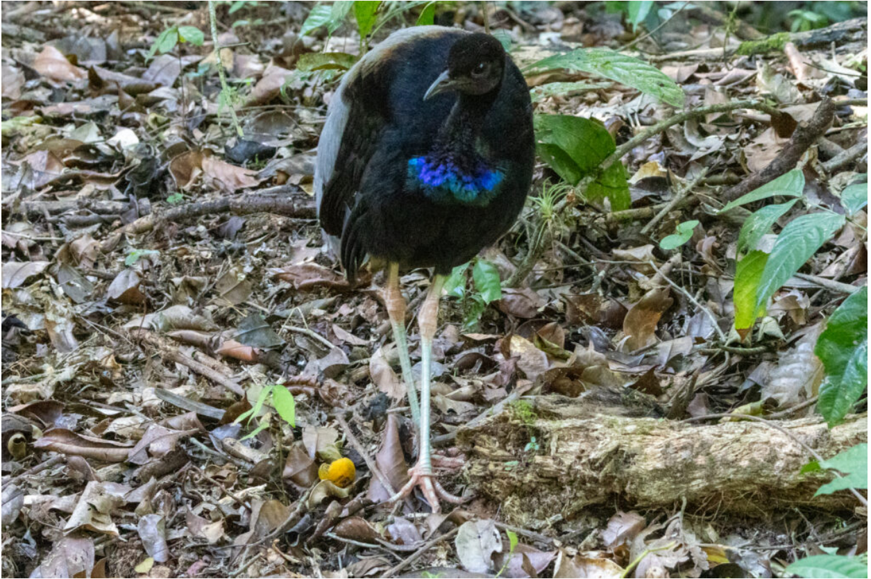
Grey-winged Trumpeter