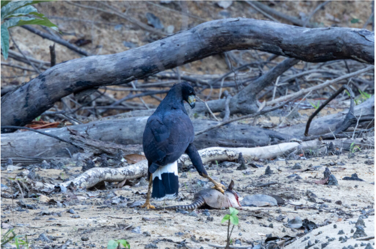
Great Black Hawk