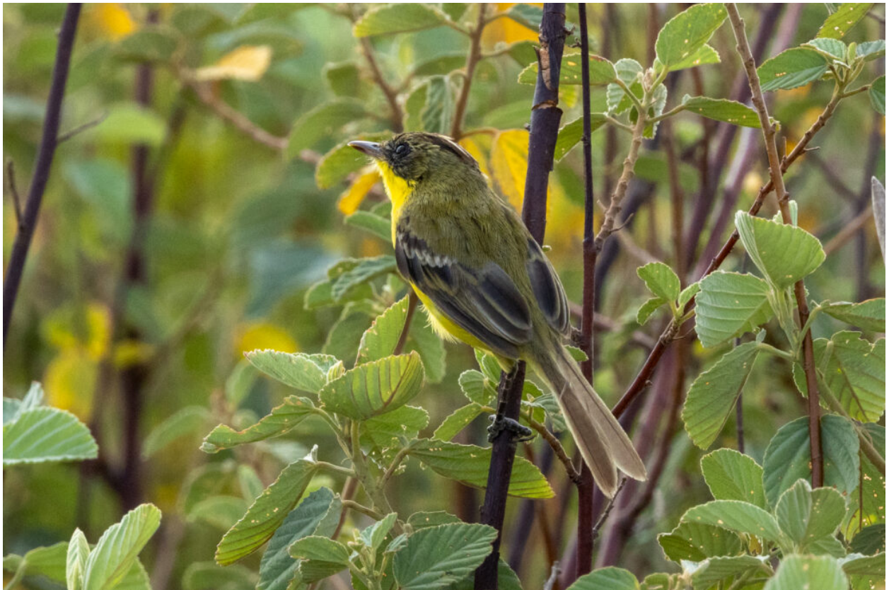
Crested Doradito