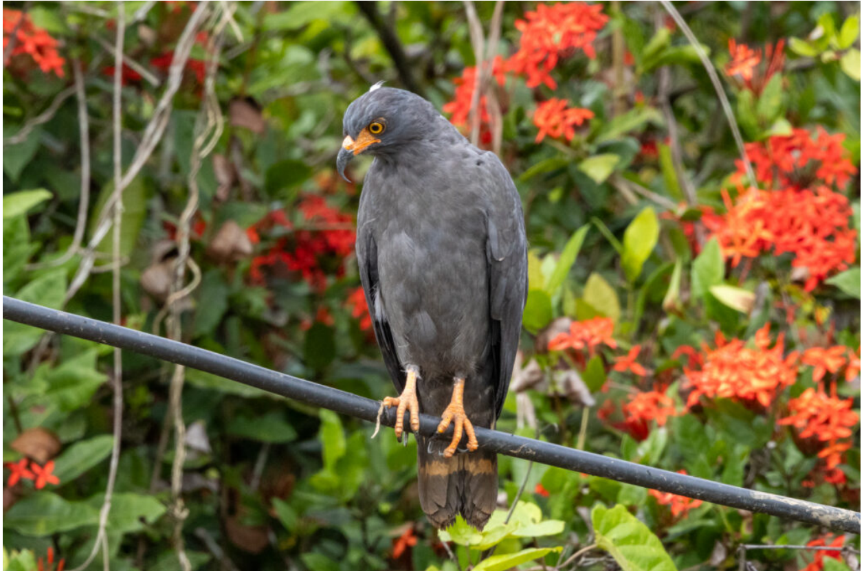
Slender-billed Kite