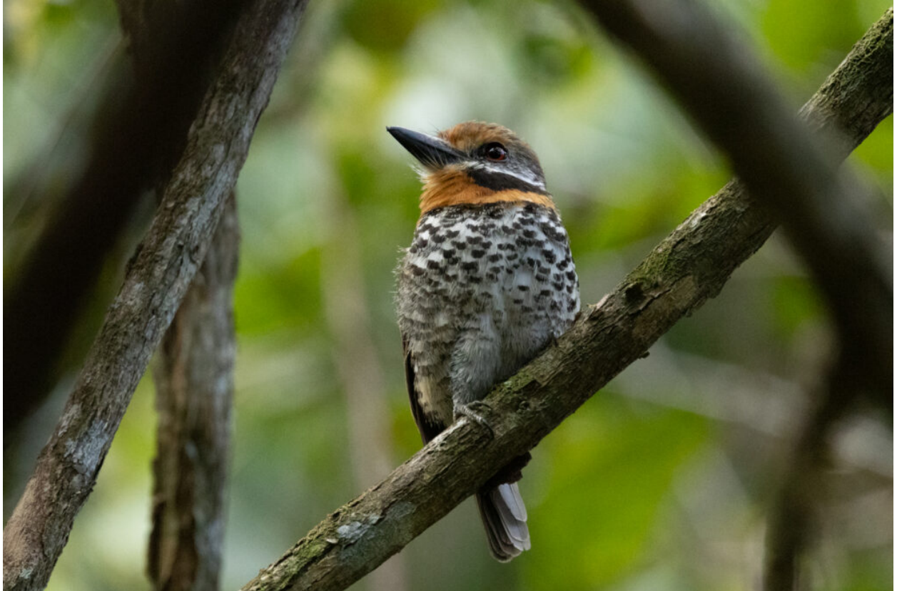
Spotted Puffbird