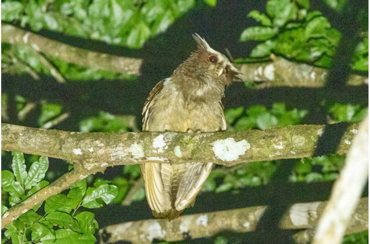
Crested Owl