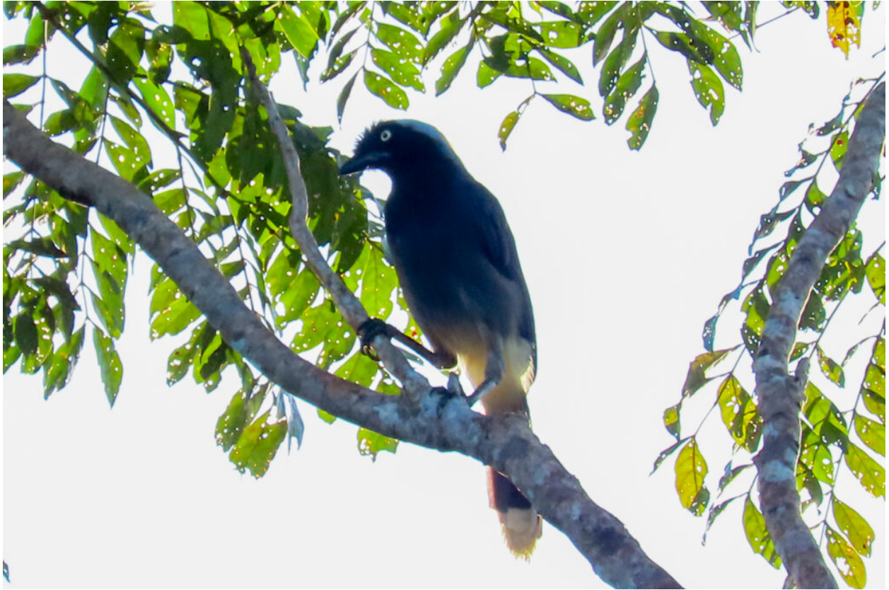
Azure-naped Jay