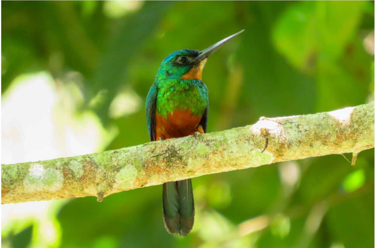
Green-tailed Jacamar