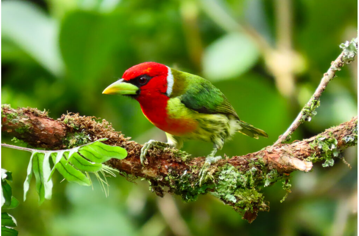
Red-headed Barbet