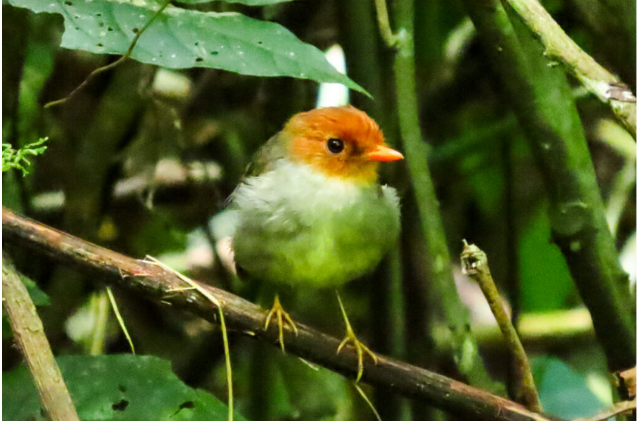
Hooded Antpitta