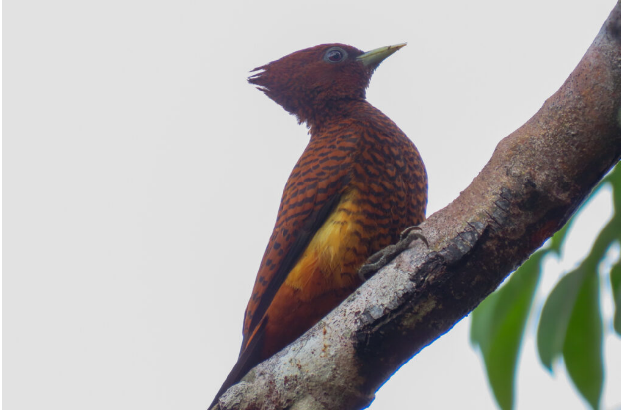
Variable Woodpecker