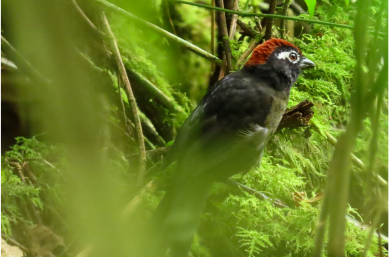
White-rimmed Brushfinch