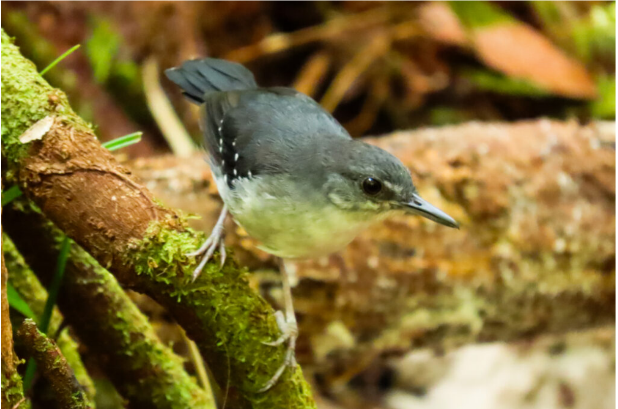
Yapacana Antbird