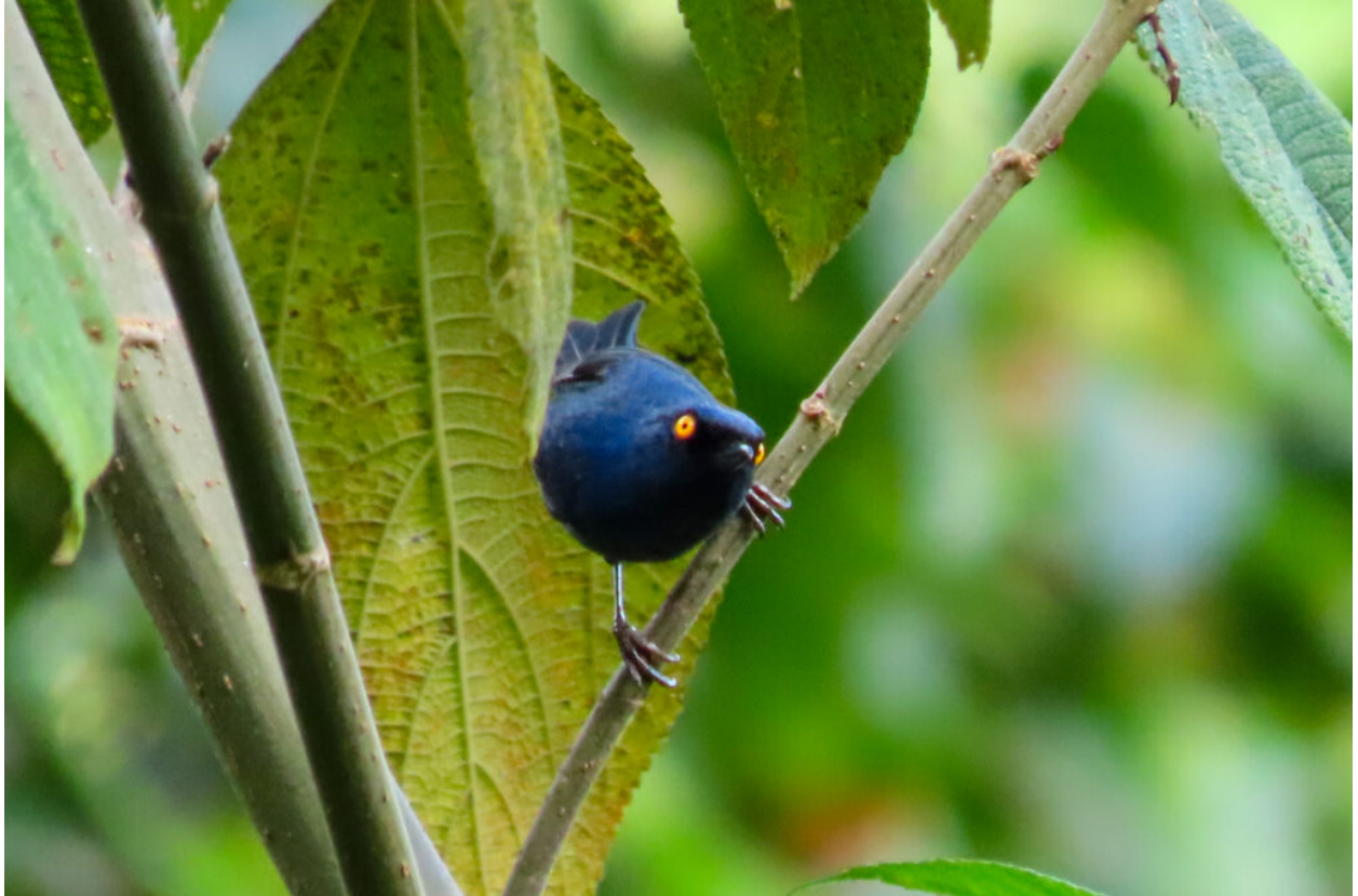
Golden-eyed Flowerpiercer