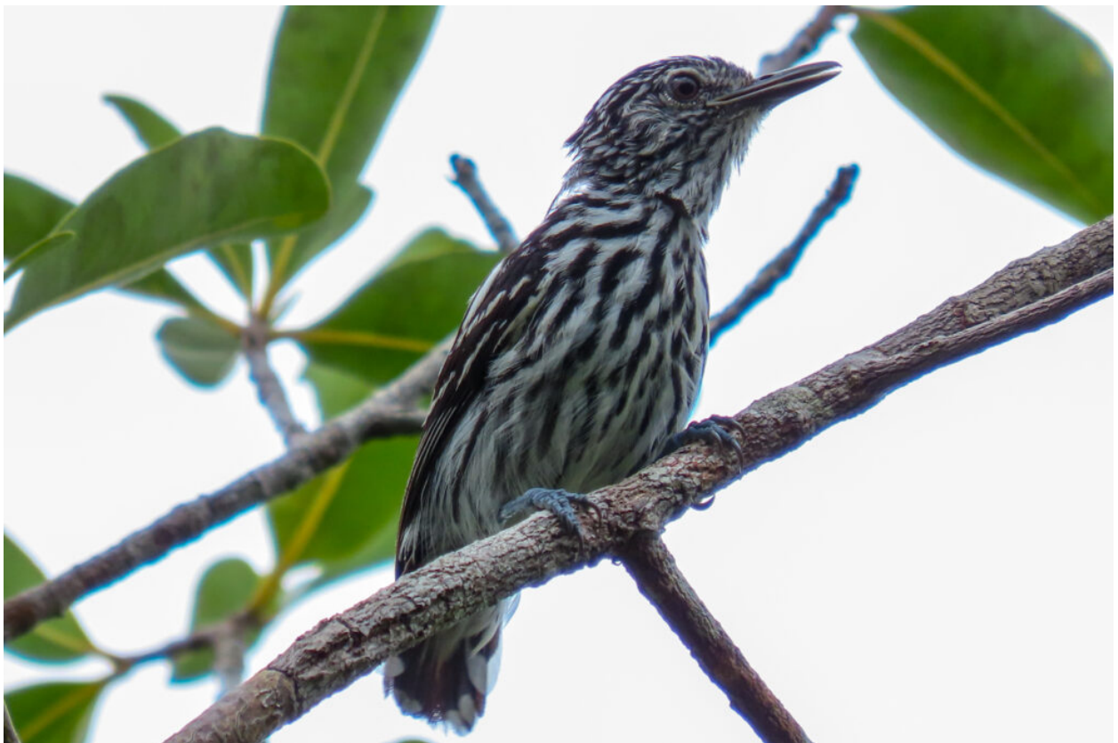
Cherrie's Antwren