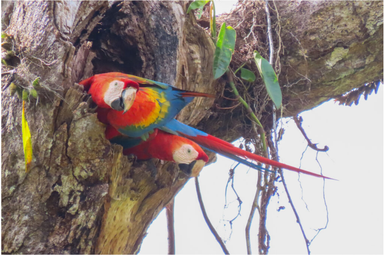
Scarlet Macaws