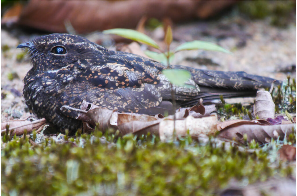
Blackish Nightjar