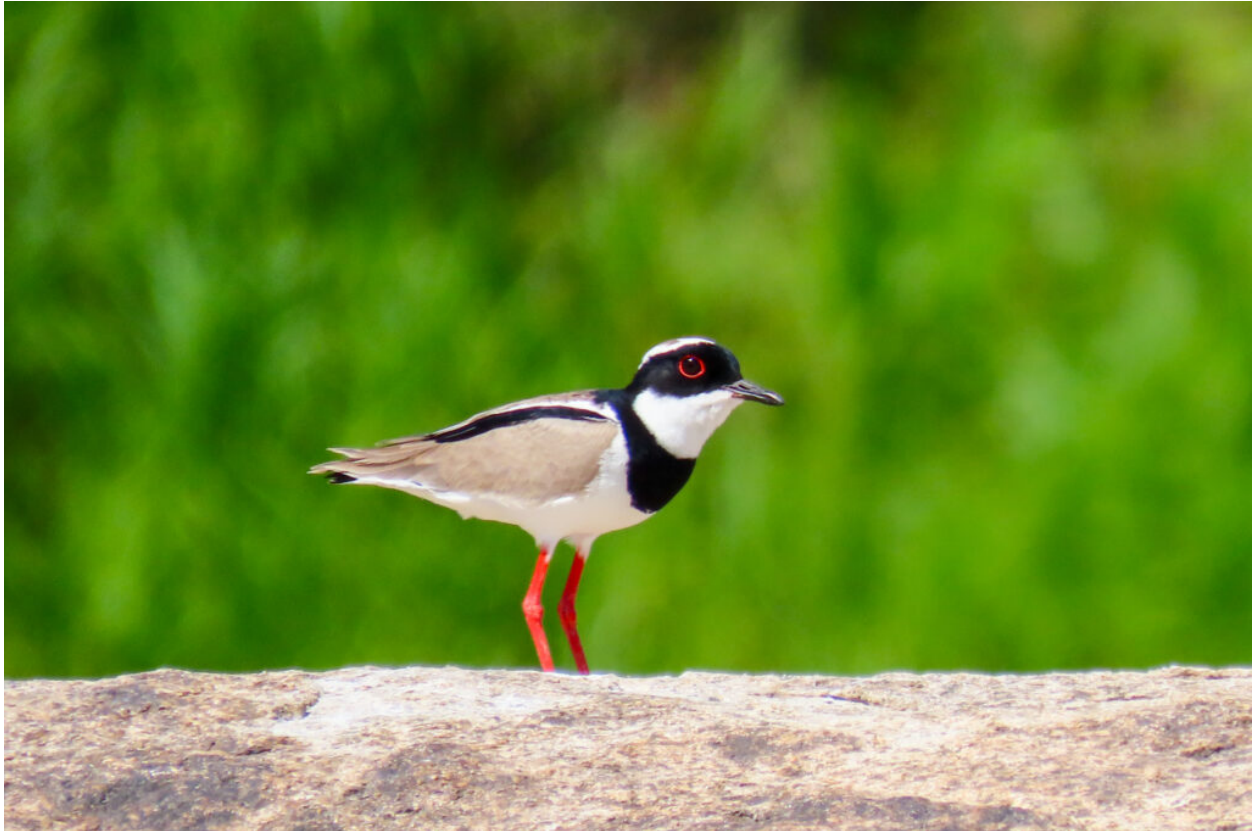
Pied Plover