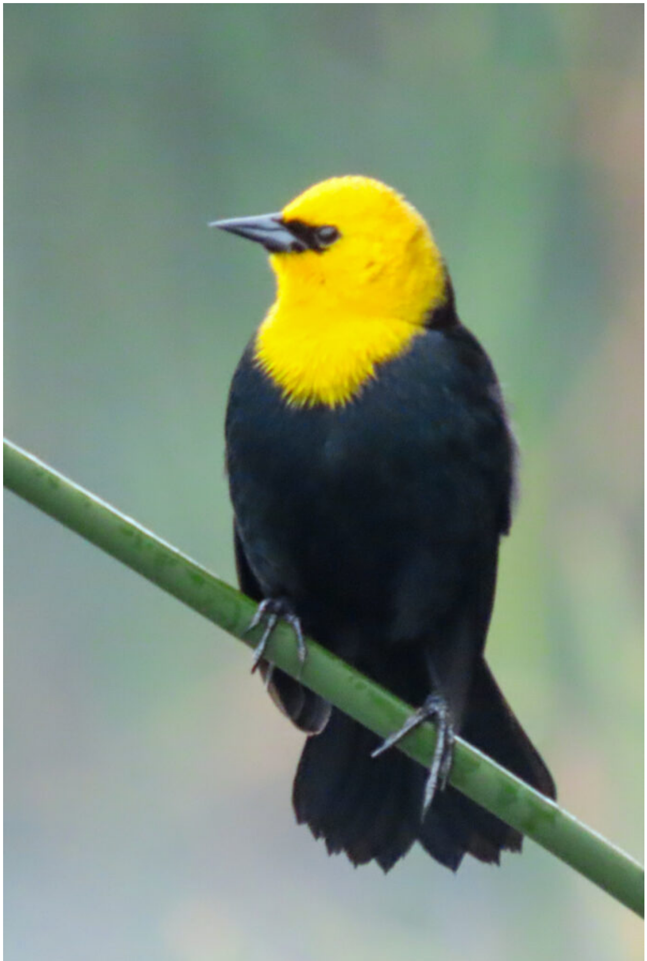
Yellow-headed Blackbird