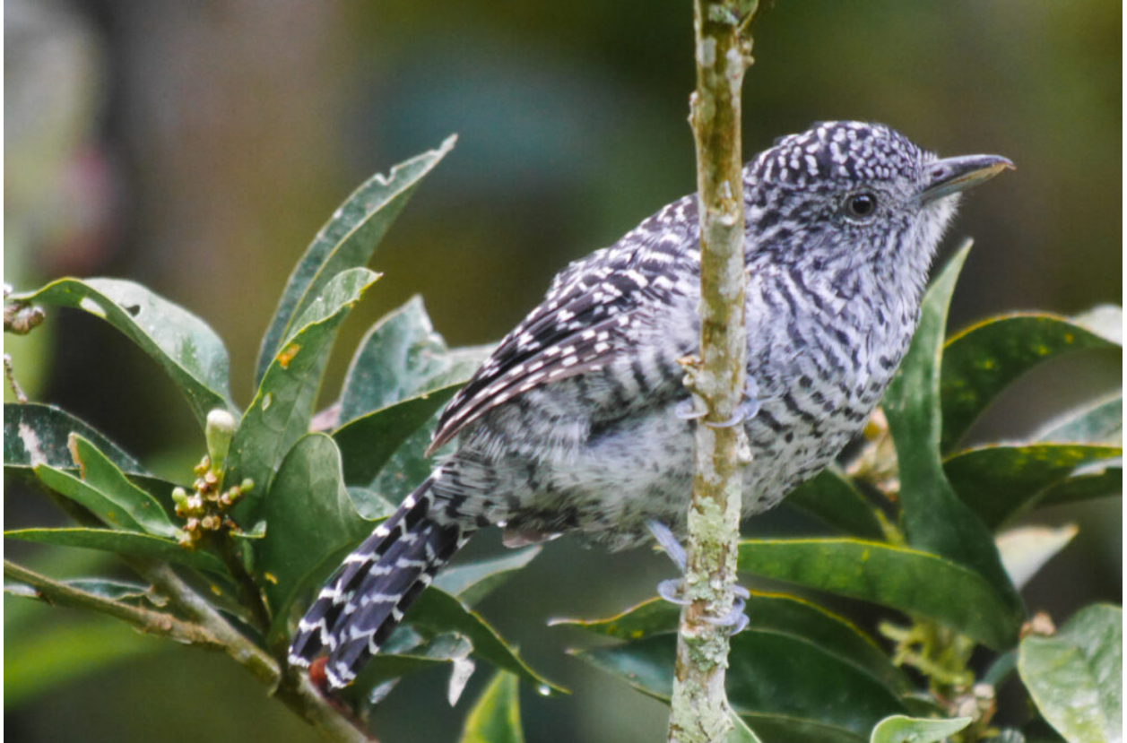
Bar-crested Antshrike