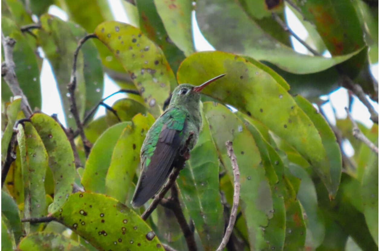
Green-tailed Goldenthrout