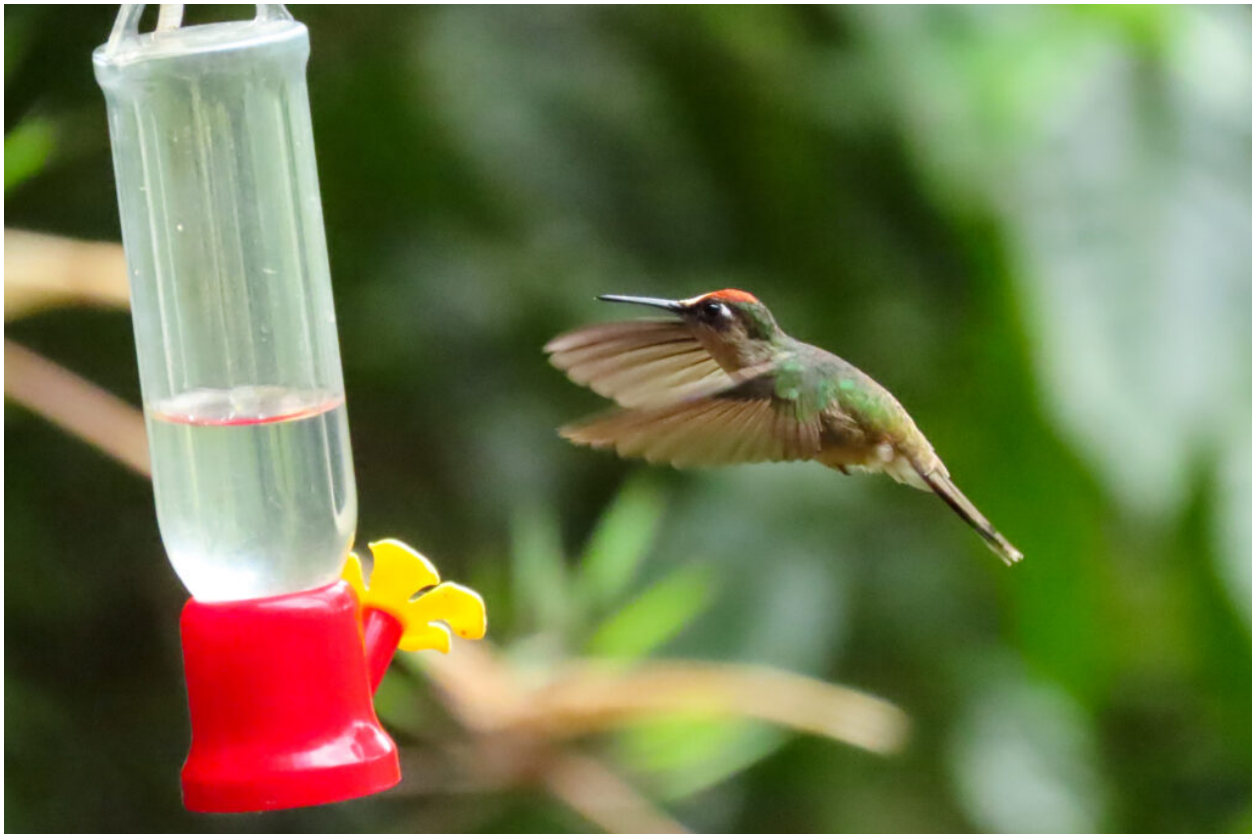
Tolima Blossomcrown