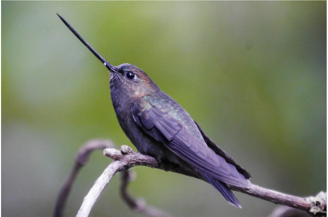
Green-fronted Lancebill