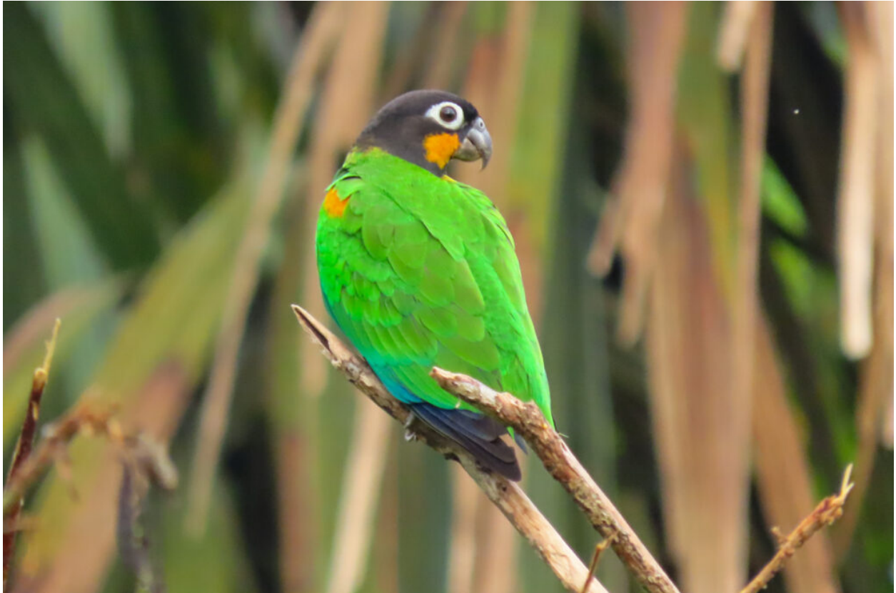
Orange-cheeked Parrot

Brazilian Guinea Pig Cavia aperea Several were seen at the La Florida Park in Bogota, where it was introduced.