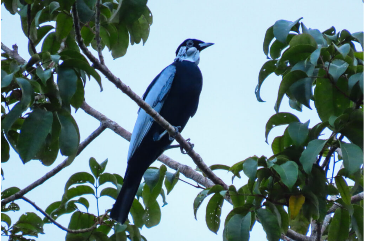
Bare-necked Fruitcrow