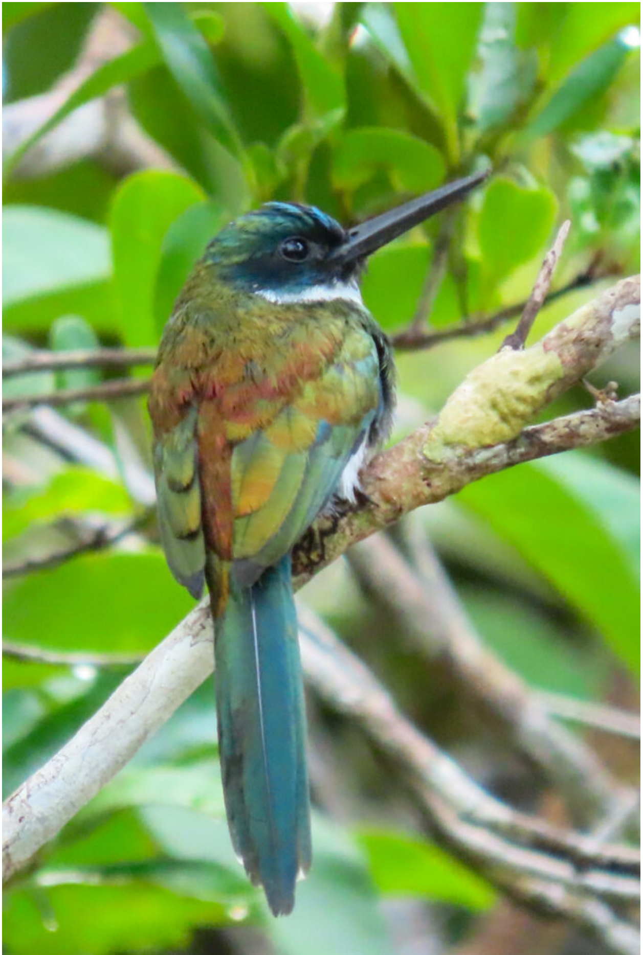
Bronzy Jacamar