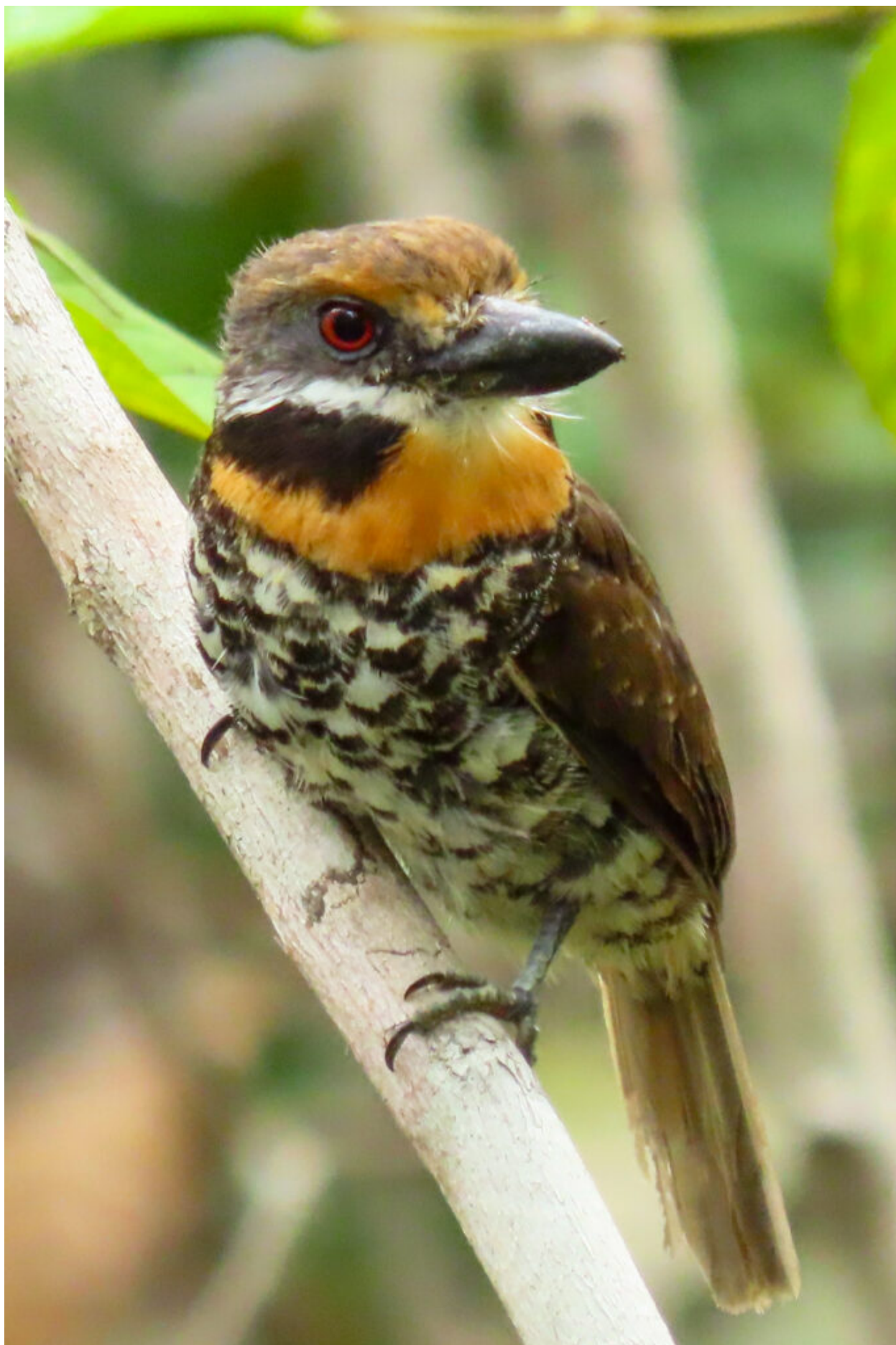
Spotted Puffbird