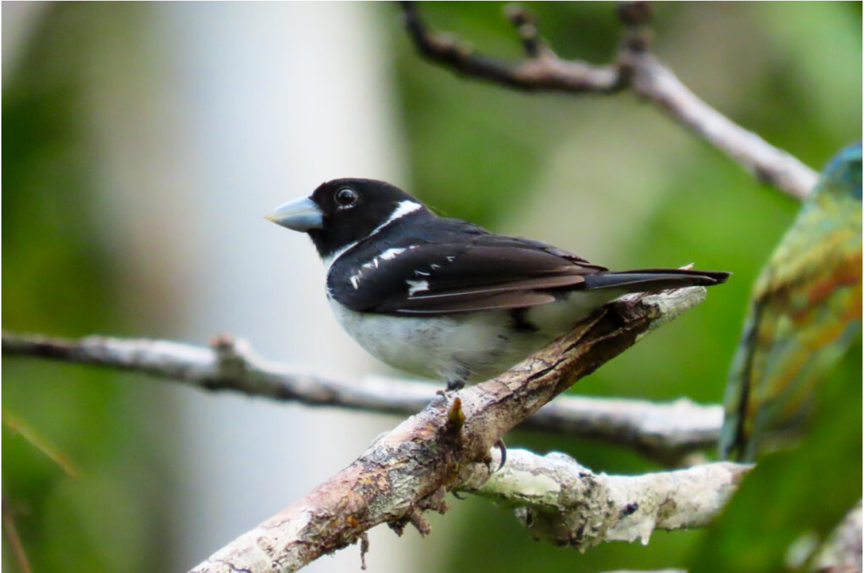
White-naped Seedeater