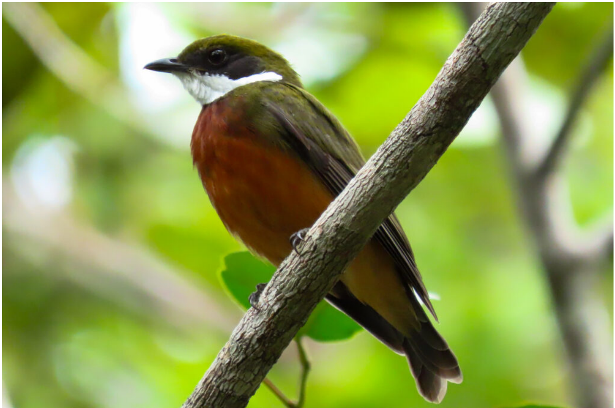
Yellow-crowned Manakin