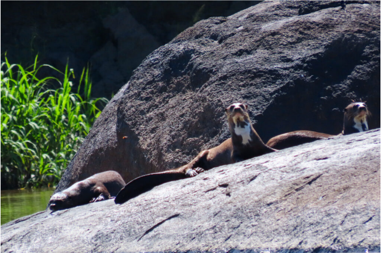
Giant Otters