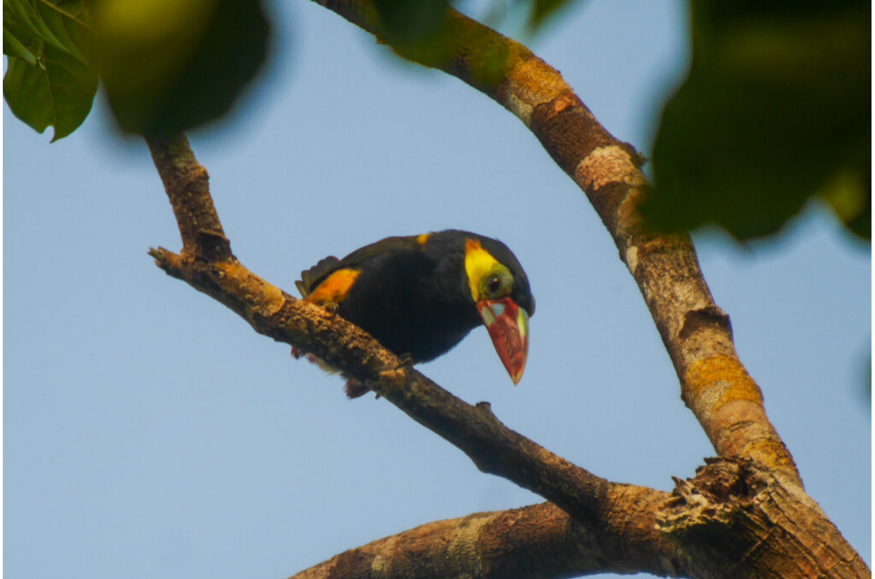
Tawny-tufted Toucanet