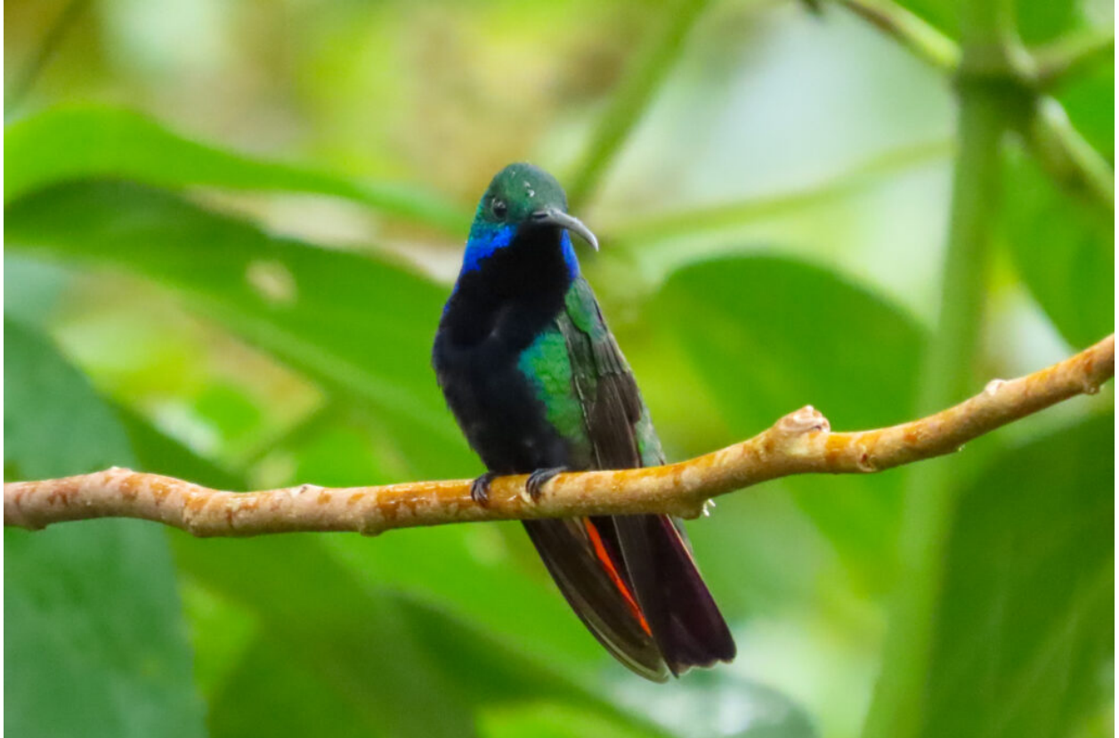
Black-throated Mango