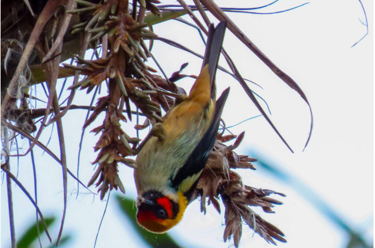
Flame-faced Tanager