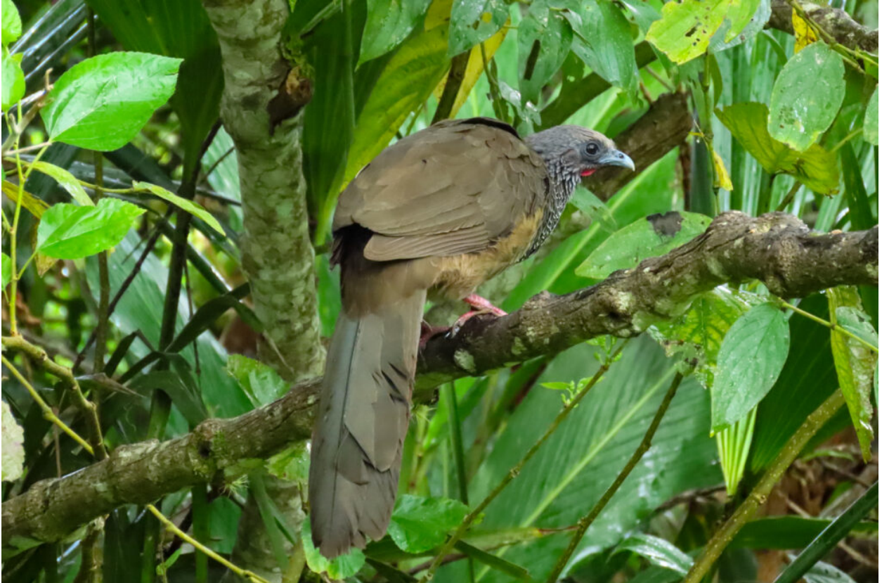
Colombian Chachalaca