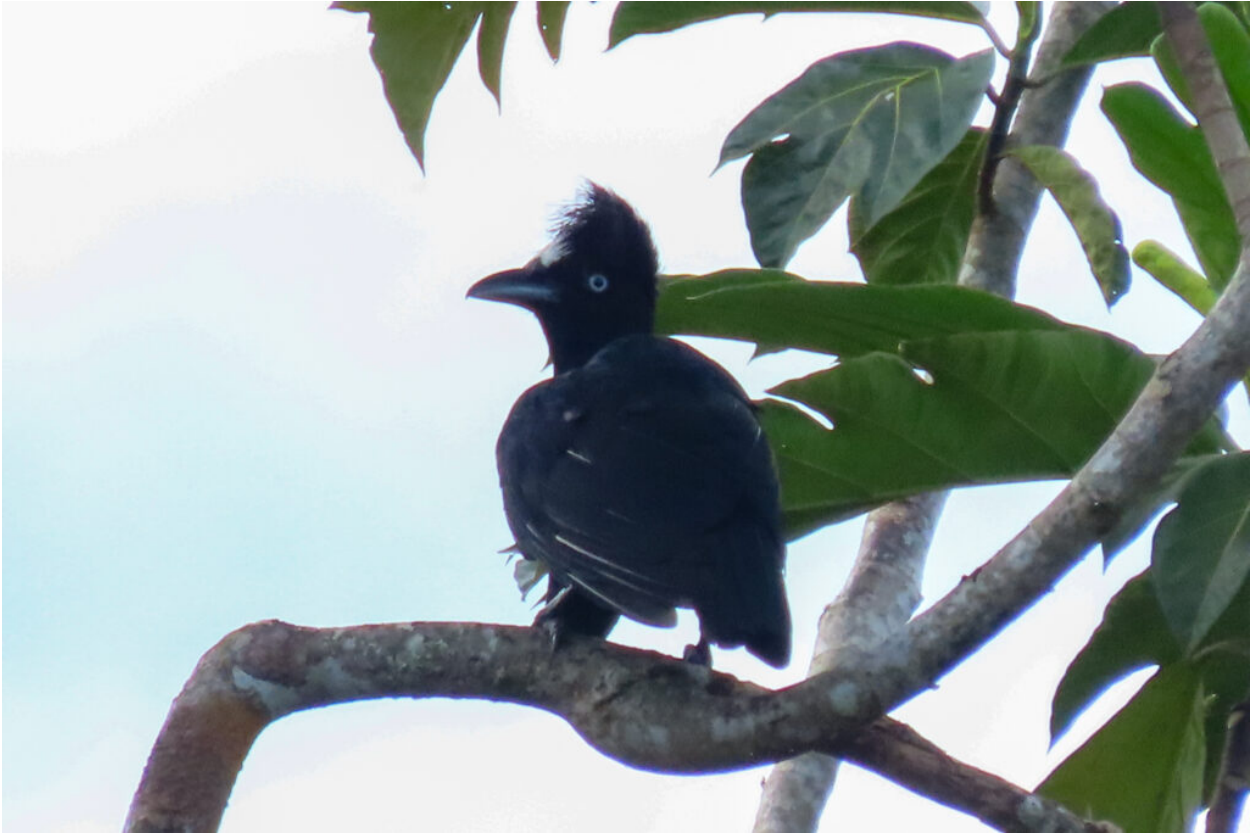
Amazonian Umbrellabird