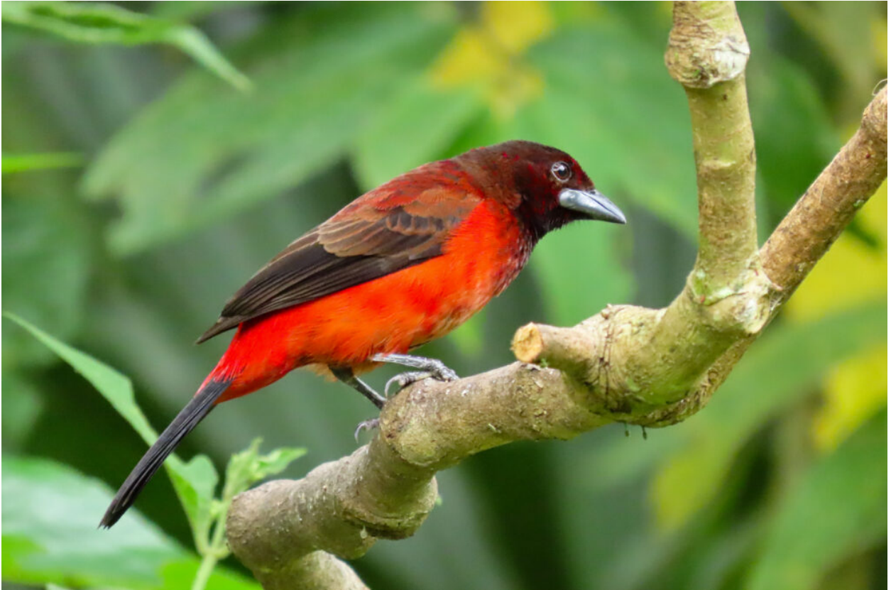
Crimson-backed Tanager