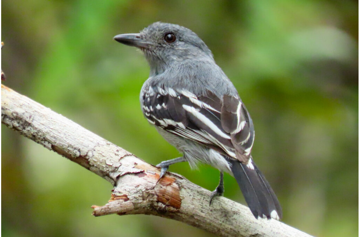
Amazonian Antshrike