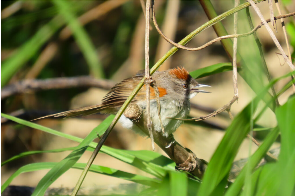
Rio Orinoco Spinetail