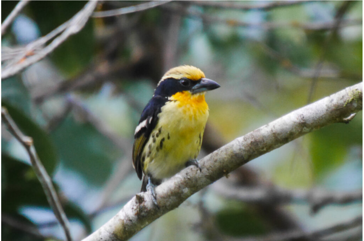
Gilded Barbet