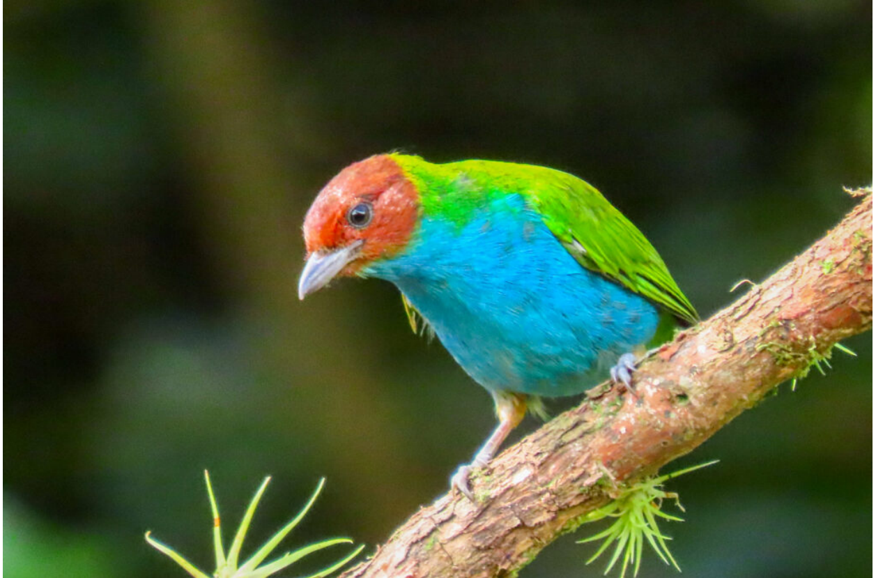
Bay-headed Tanager