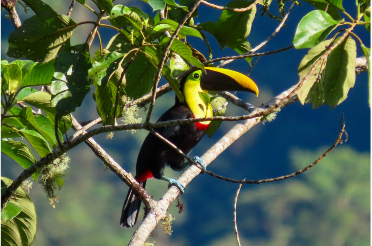
Yellow-throated Toucan