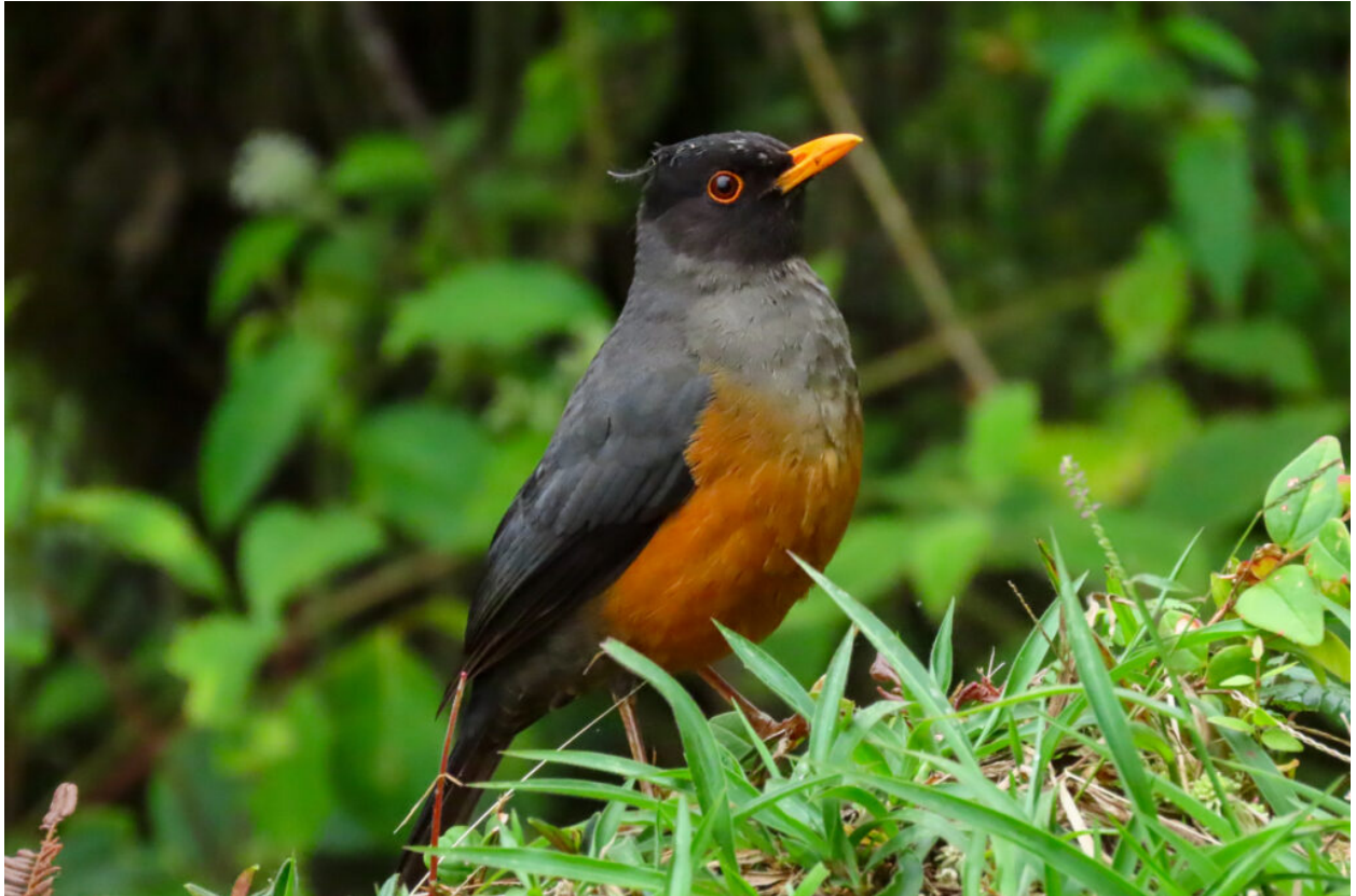
Chestnut-bellied Thrush