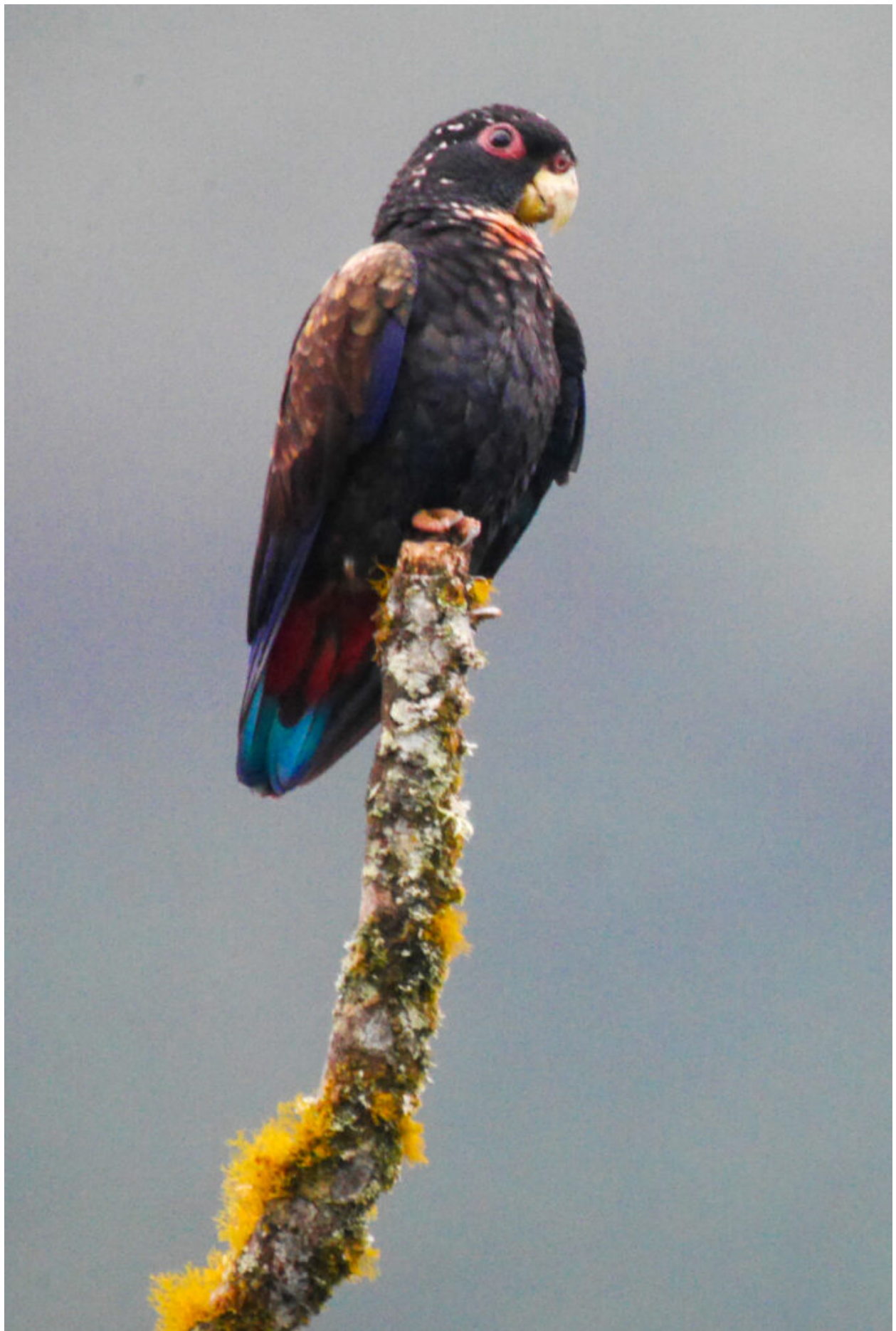
Bronze-winged Parrot