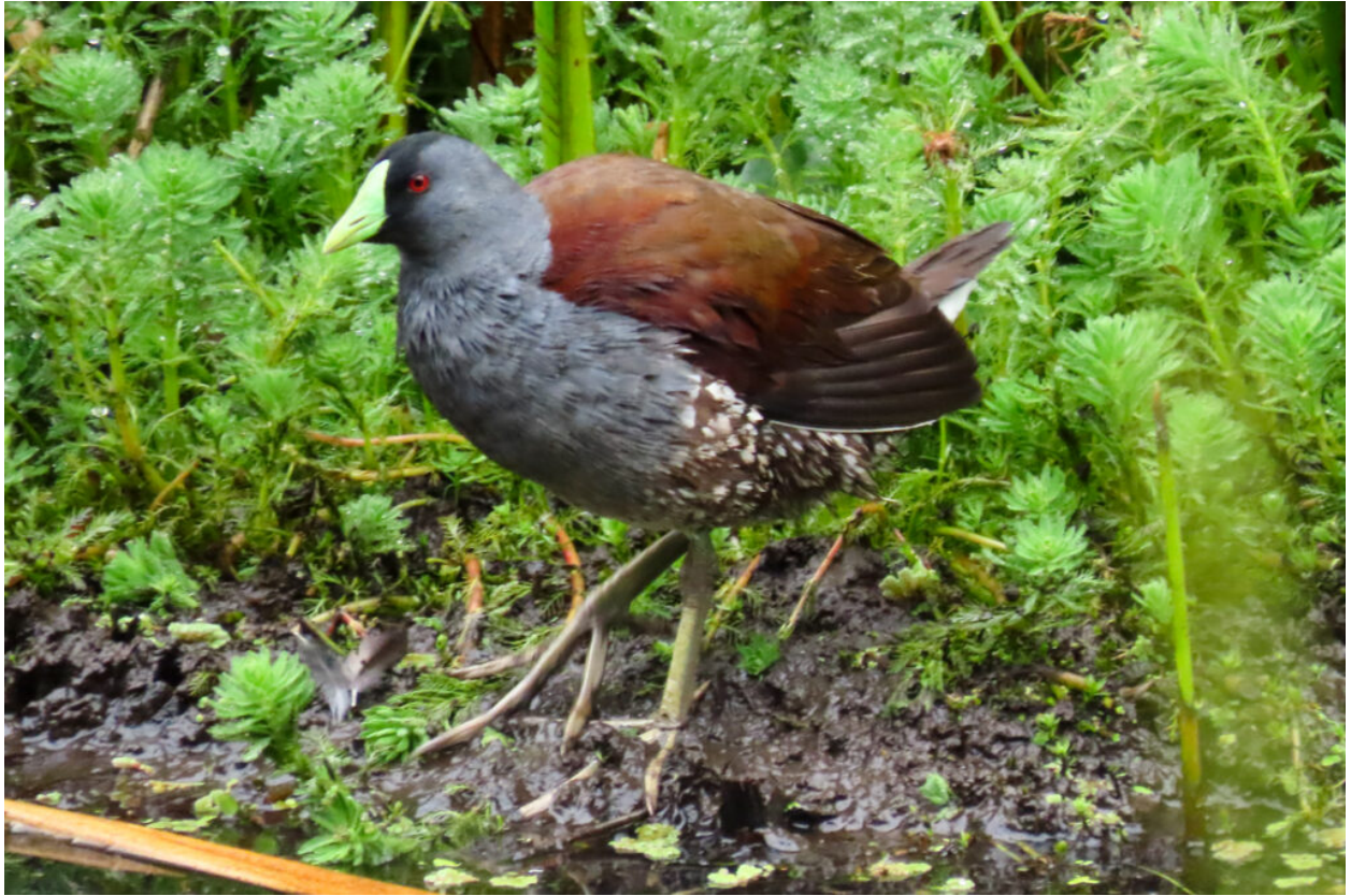
Spot-flanked Gallinule