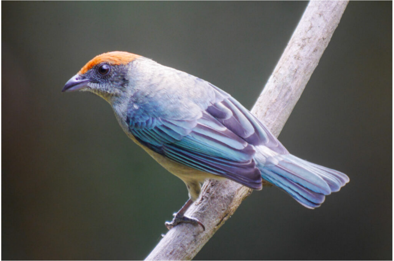
Scrub Tanager