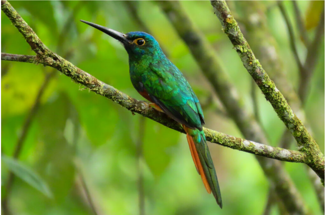
Coppery-chested Jacamar