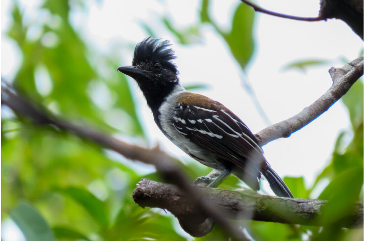
Black-crested Antshrike