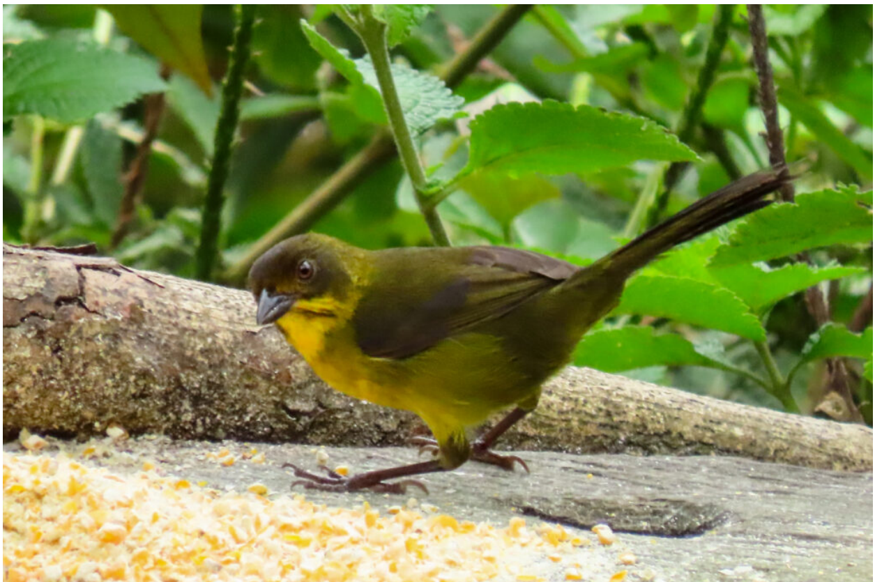
Dusky-headed Brushfinch