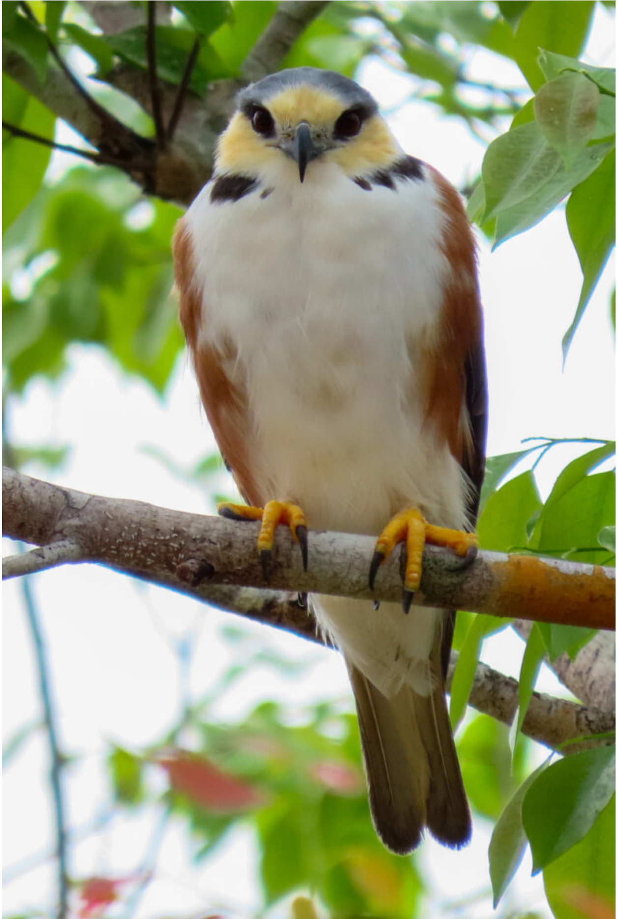
Pearl Kite