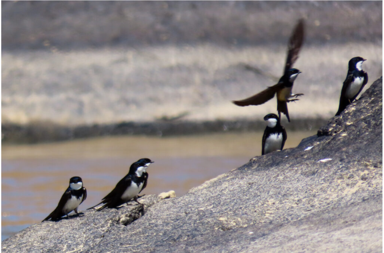
Black-collared Swallows