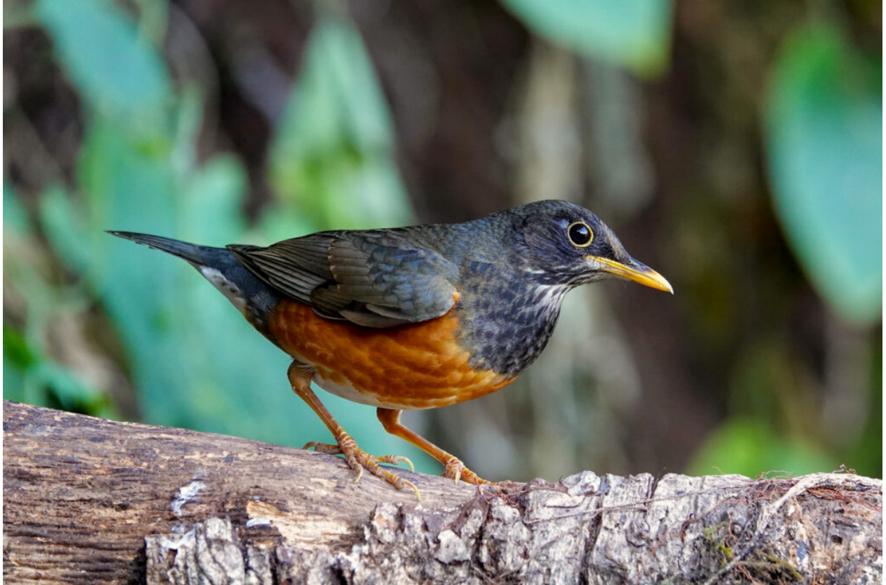
Black-breasted Thrush