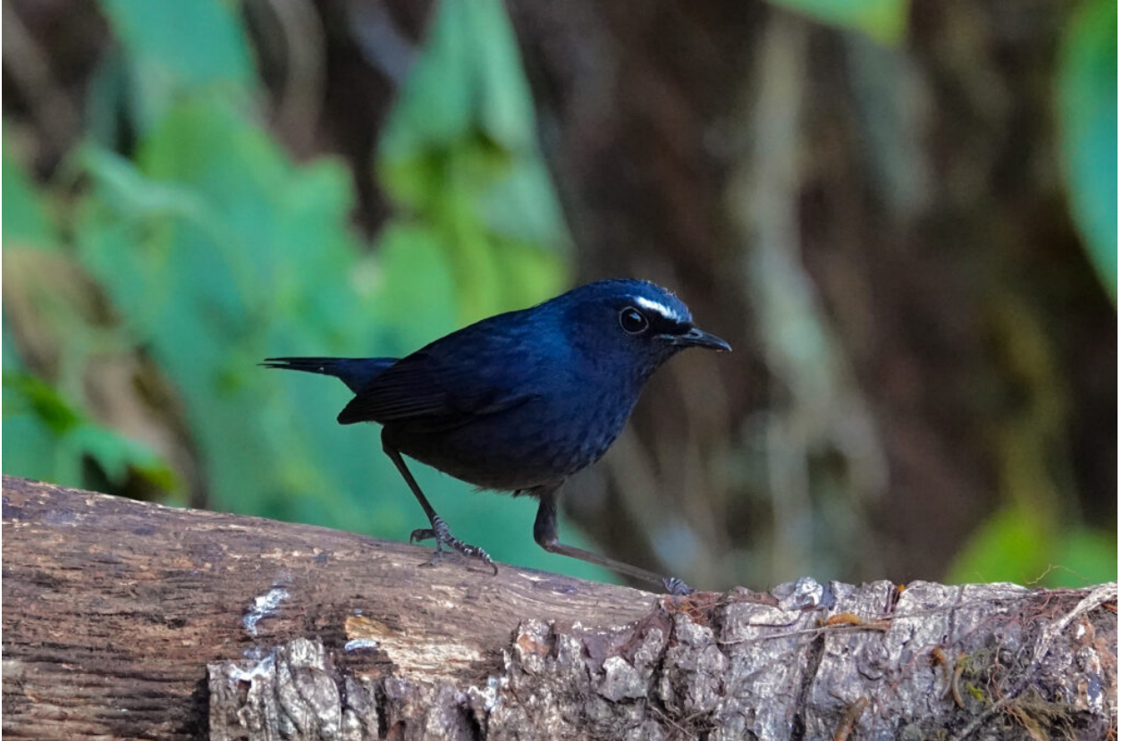
Himalayan Shortwing