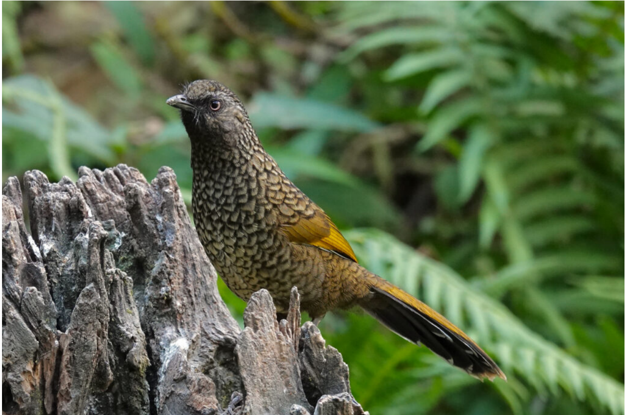
Scaly Laughingthrush