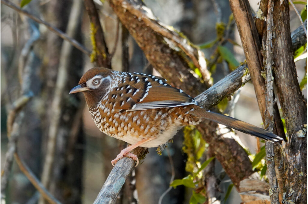
White-speckled Laughingthrush (image by Craig Robson)