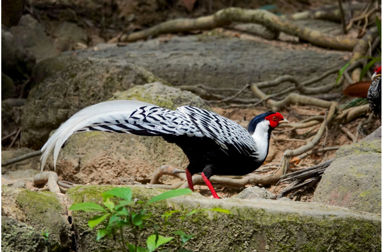
Silver Pheasant