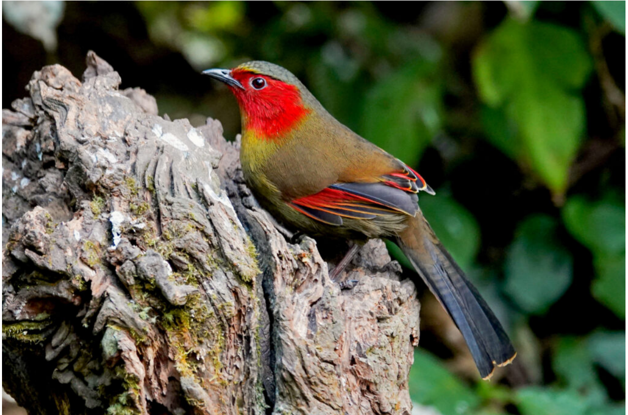
Scarlet-faced Liocichla