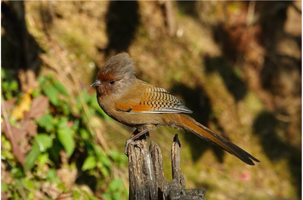
Rusty-fronted Barwing