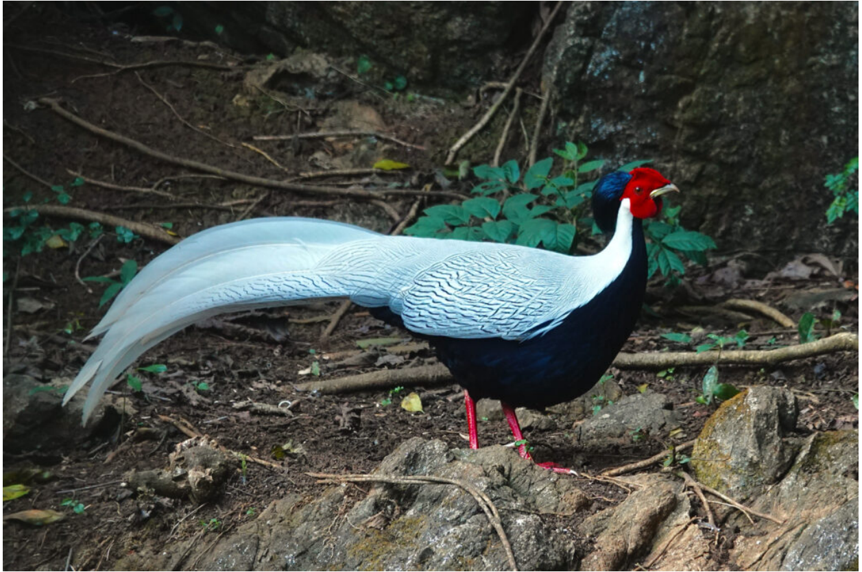
Silver Pheasant