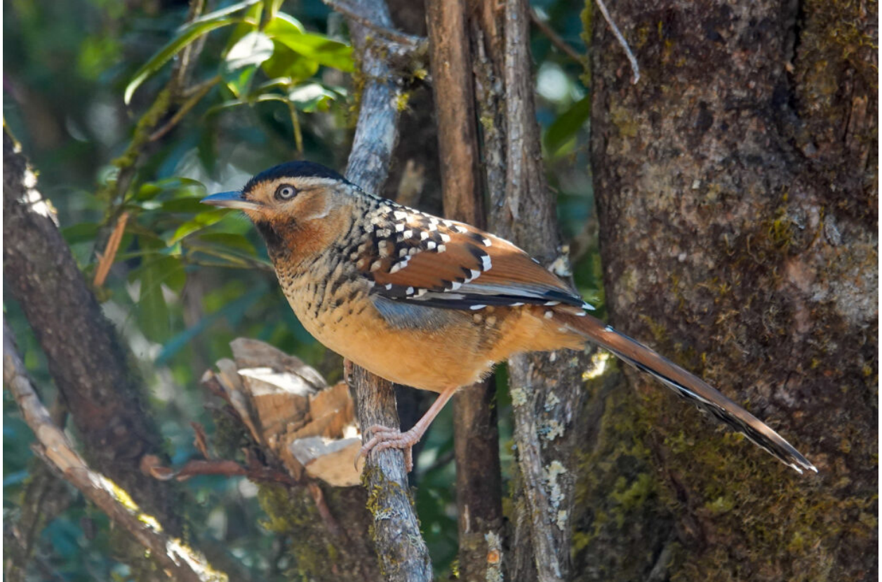
Spotted Laughingthrush