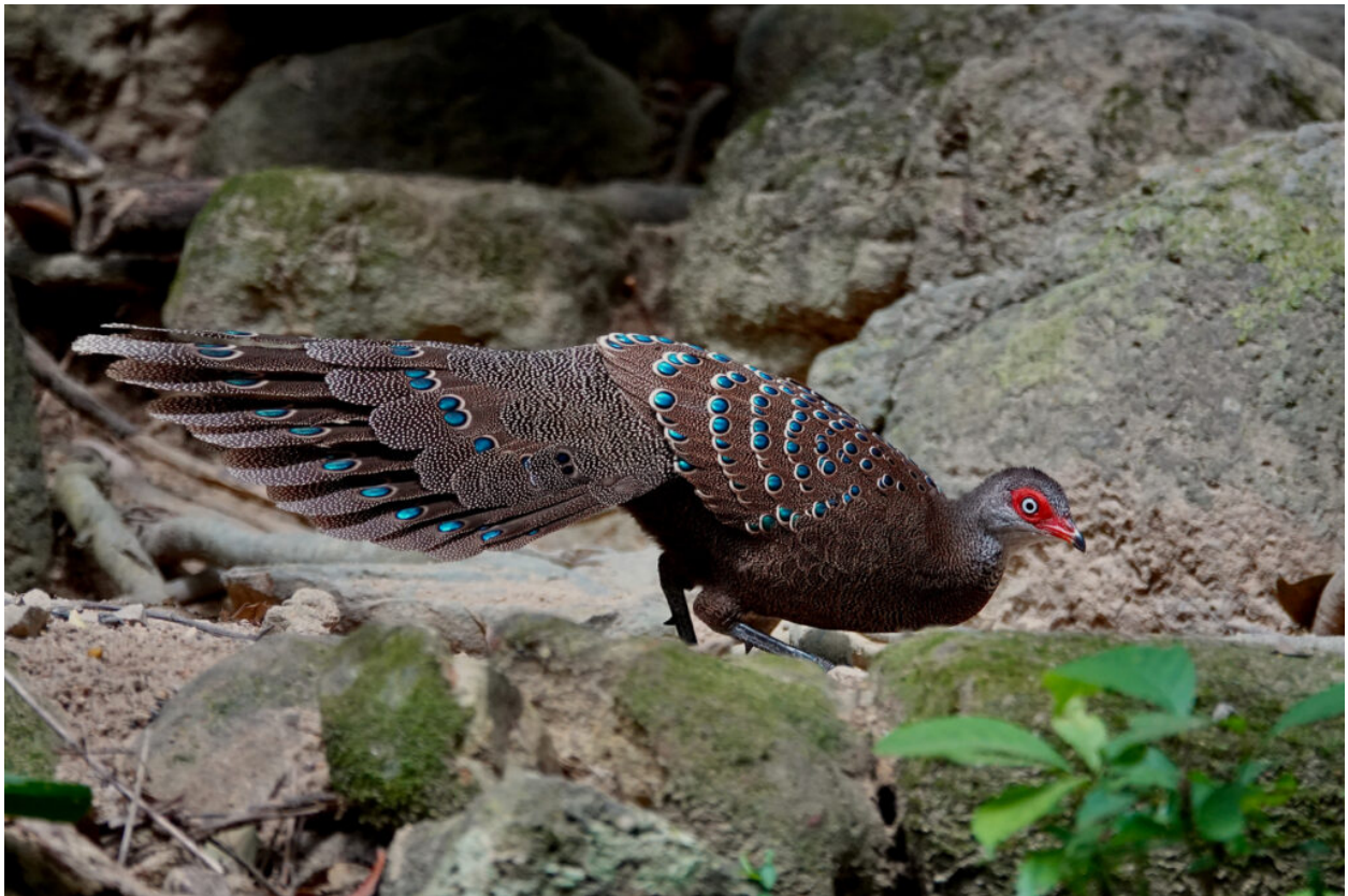
Hainan Peacock Pheasant

Centipede Grass Orchid Zeuxine strateumatica Salween R., Yunnan