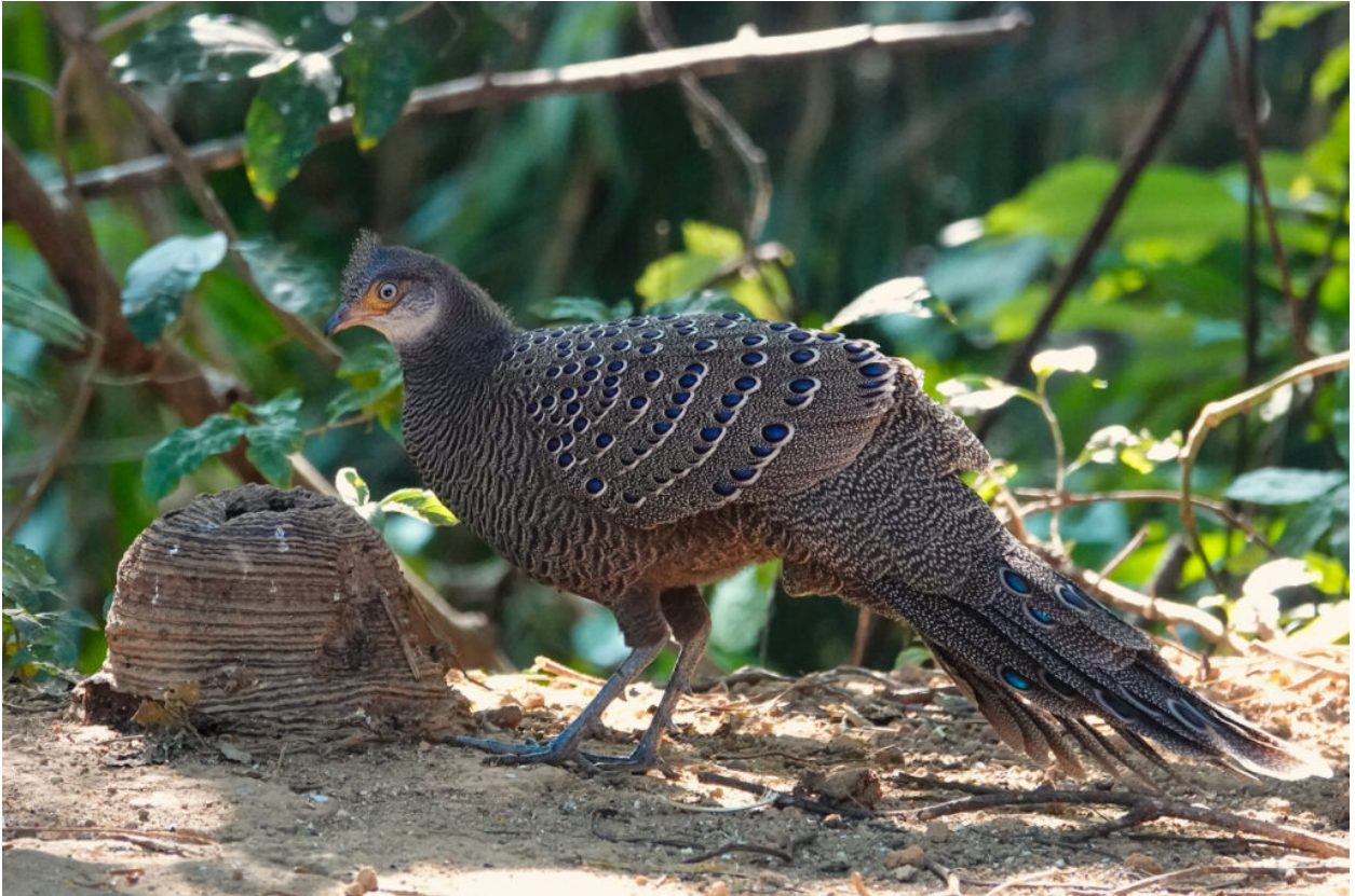
Grey Peacock Pheasant