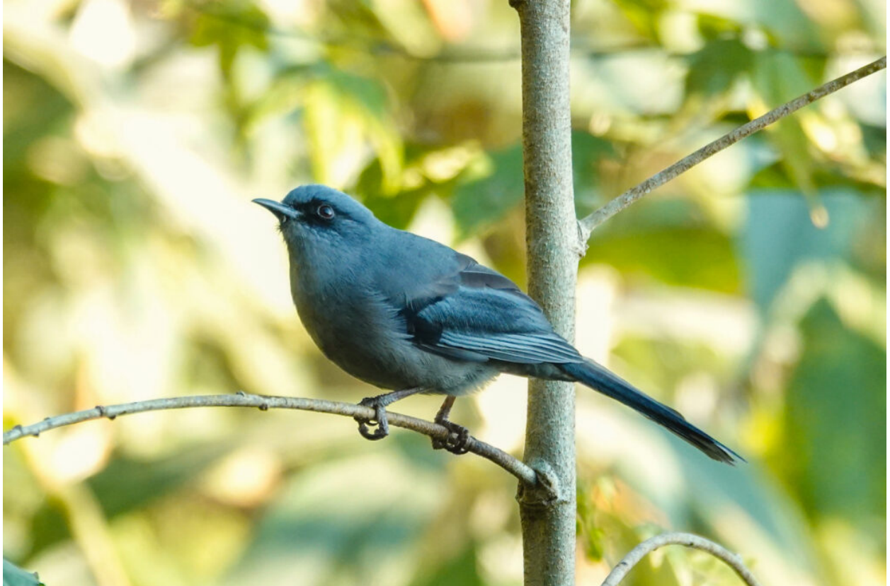
Beautiful Sibia