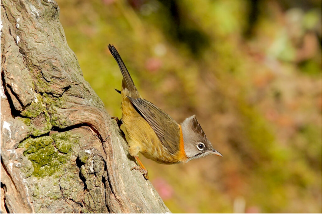
Whiskered Yuhina