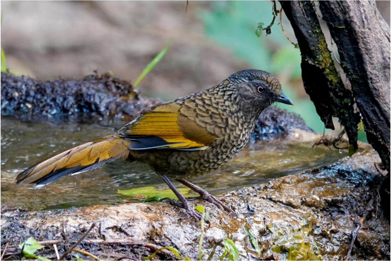
Scaly Laughingthrush