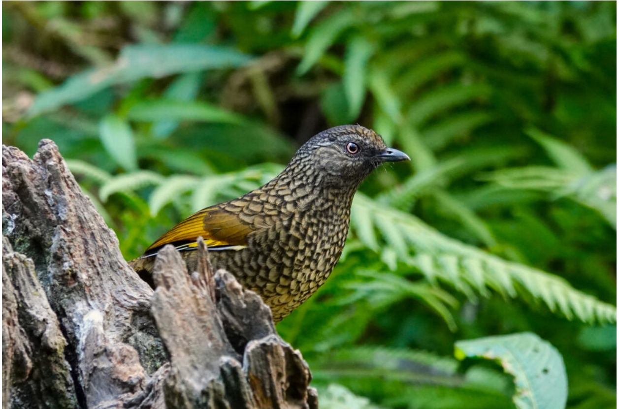
Scaly Laughingthrush