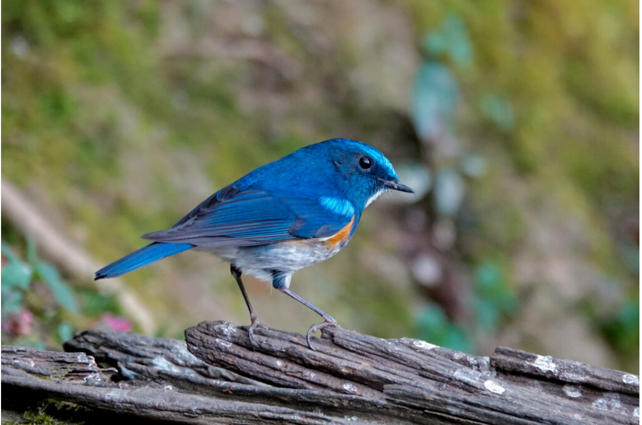
Himalayan Bluetail