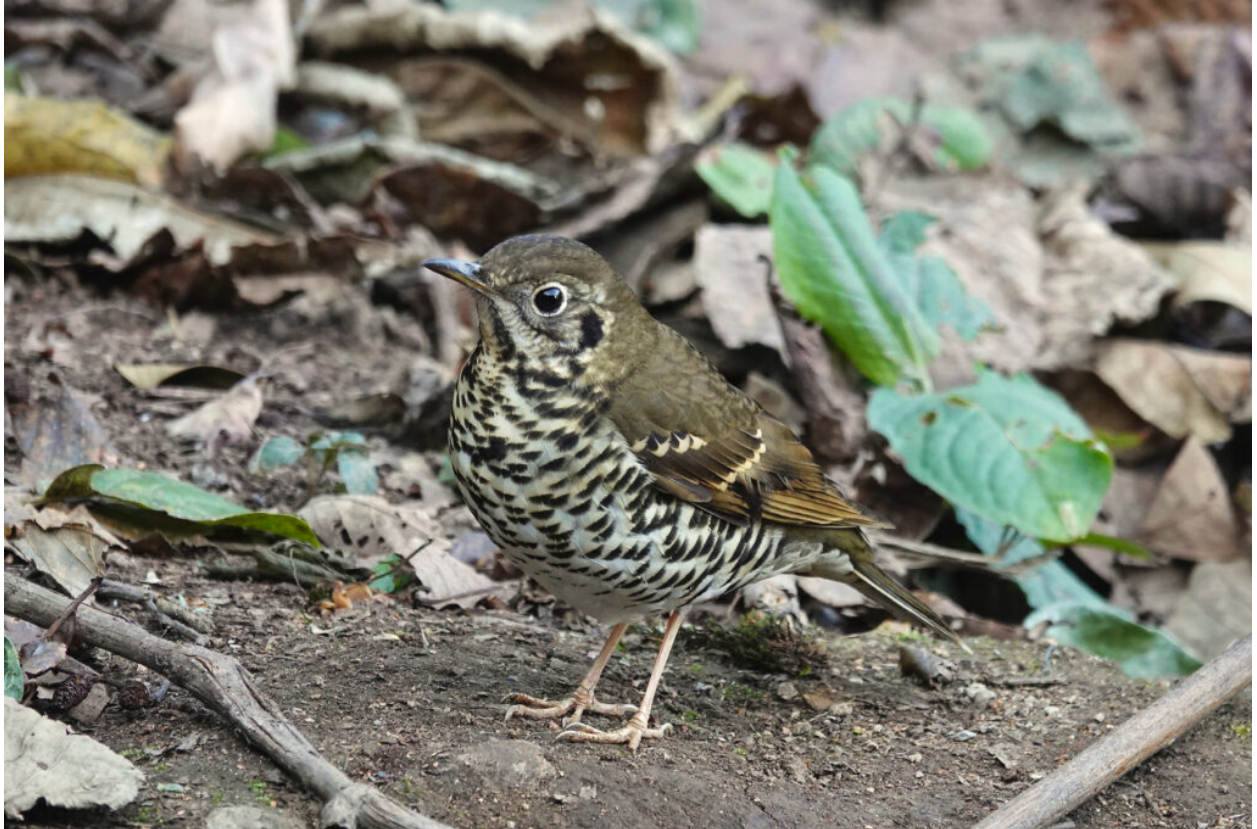
Long-tailed Thrush