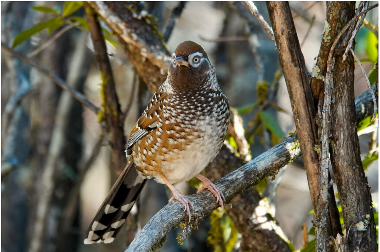
White-speckled Laughingthrush