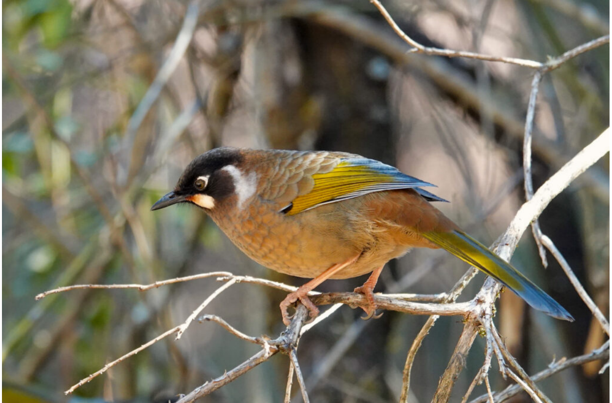
Black-faced Laughingthrush