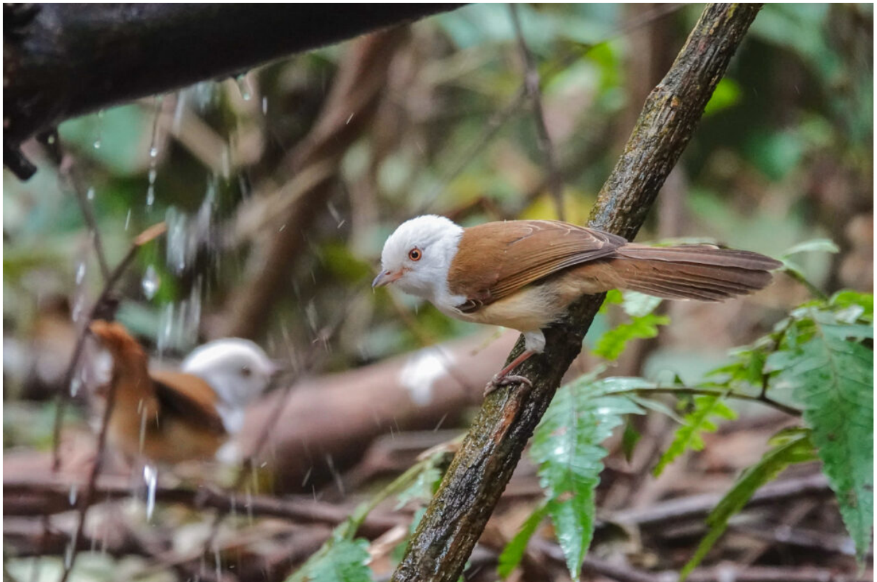
White-hooded Babblers (image by Craig Robson)