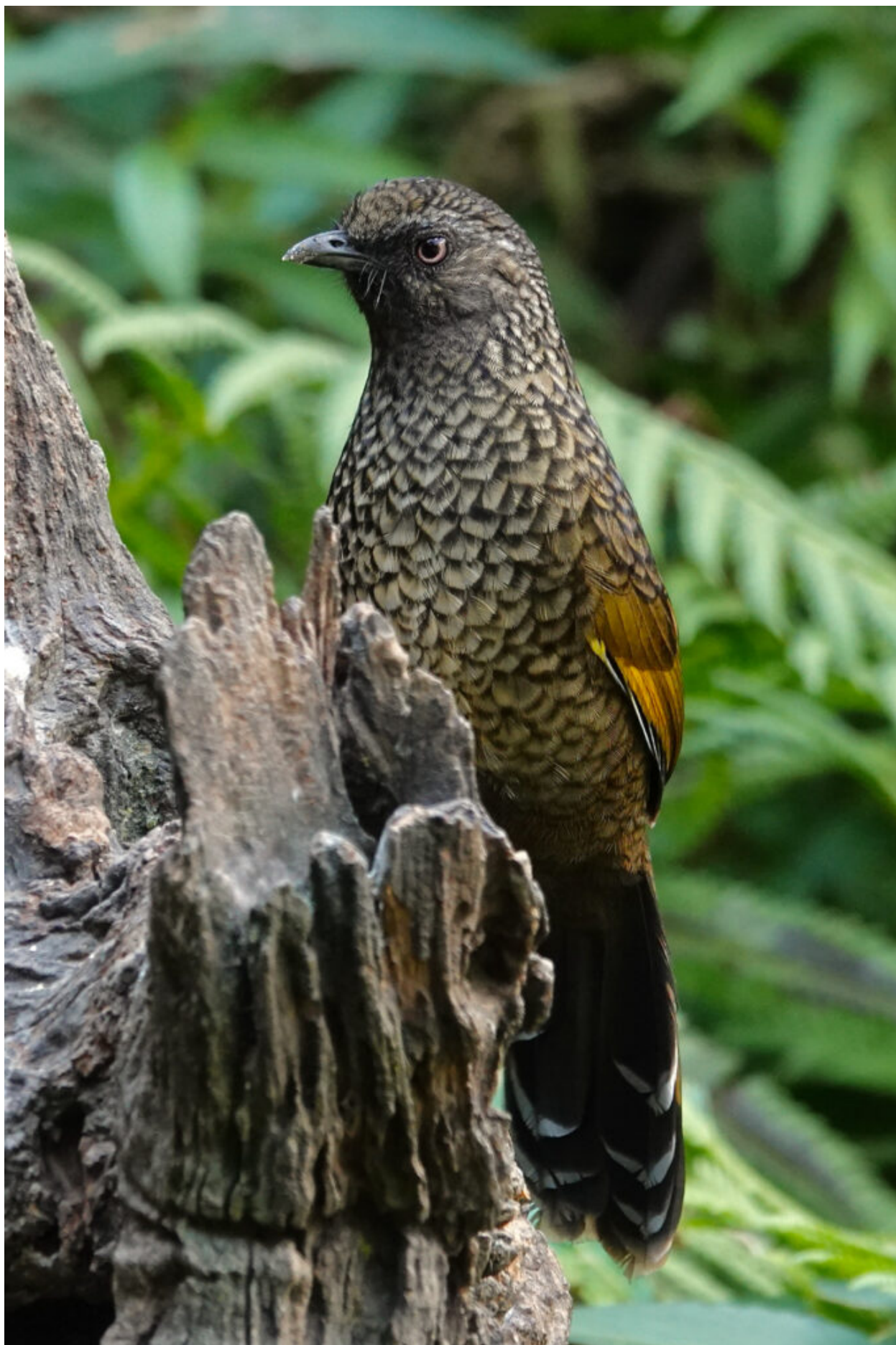
Scaly Laughingthrush