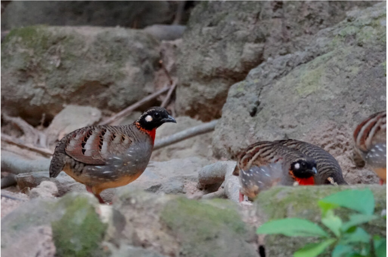
Hainan Partridges (image by Craig Robson)