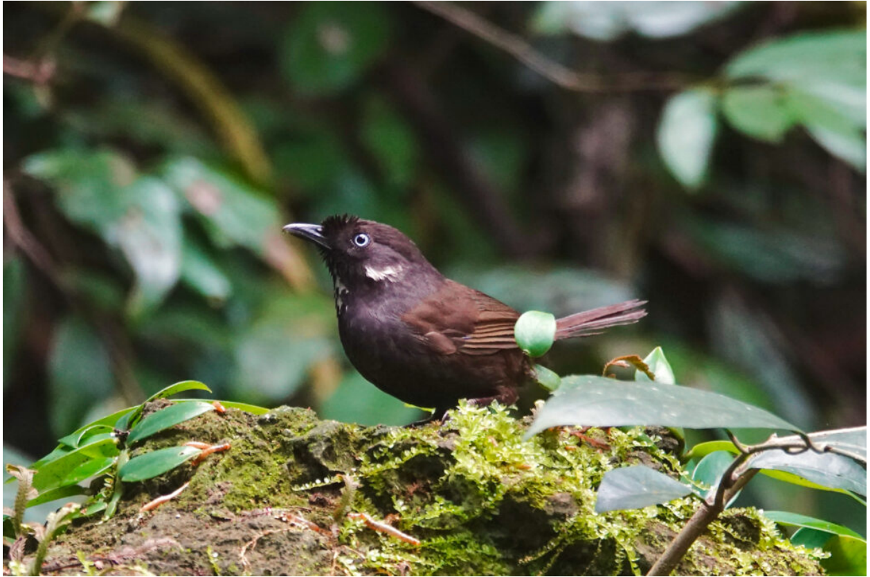
Nonggang Babbler