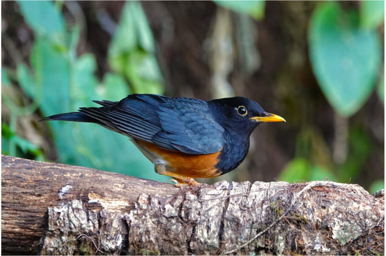
Black-breasted Thrush