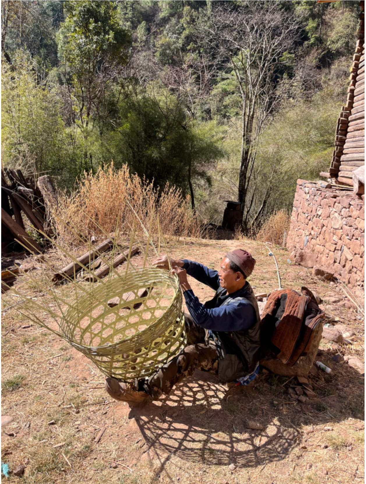
Liju Area