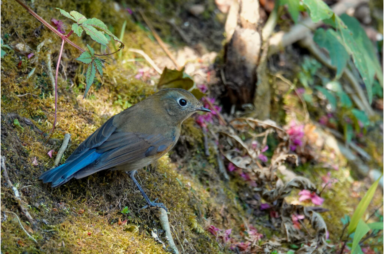
Himalayan Bluetail