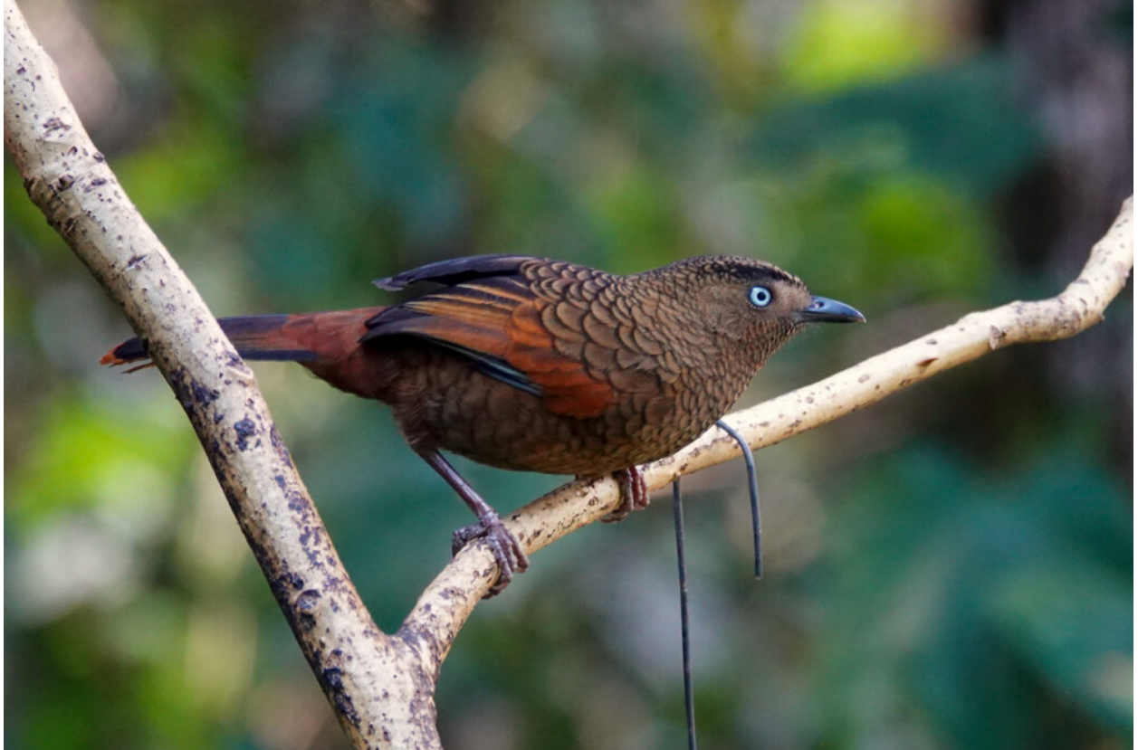
Blue-winged Laughingthrush