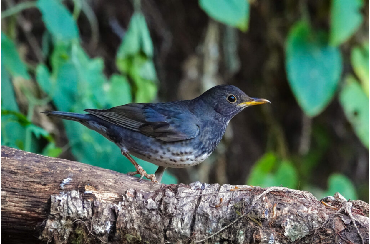
Japanese Thrush