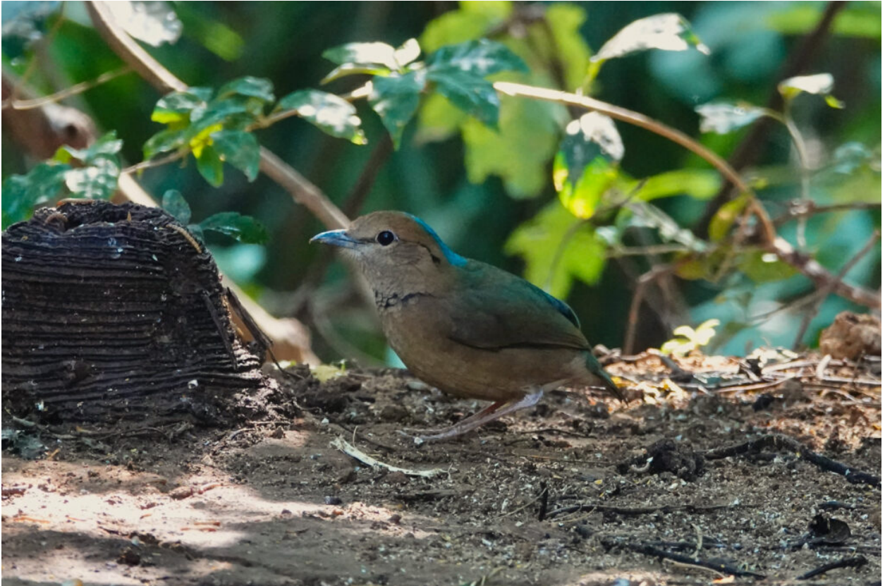
Blue-naped Pitta