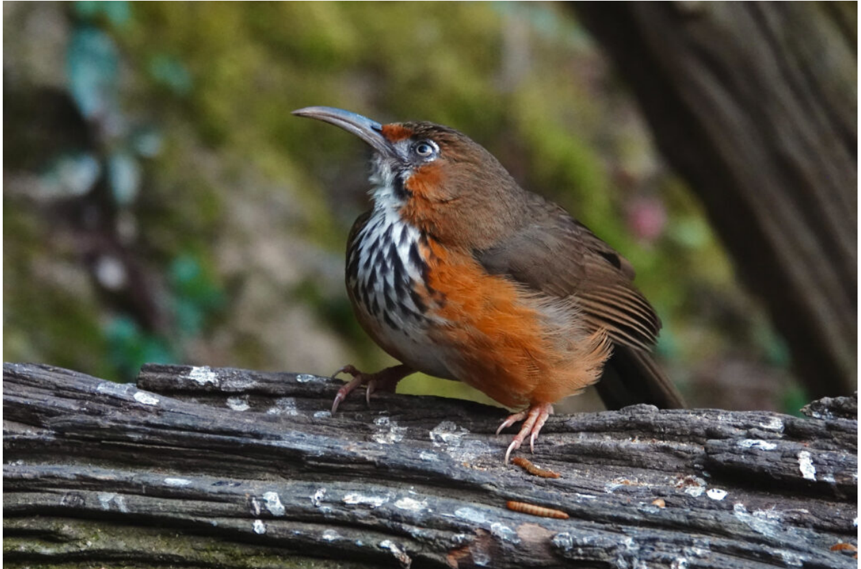
Black-streaked Scimitar Babbler