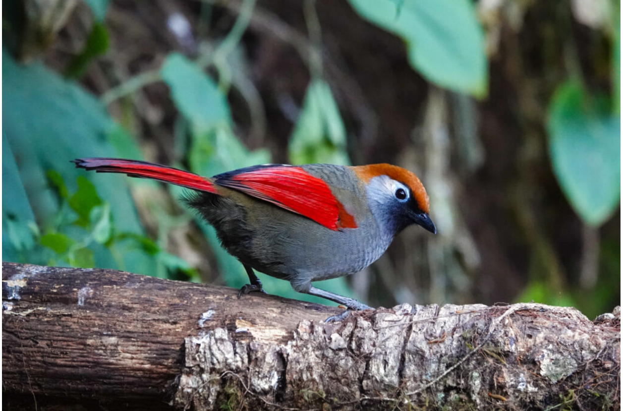
Red-tailed Laughingthrush