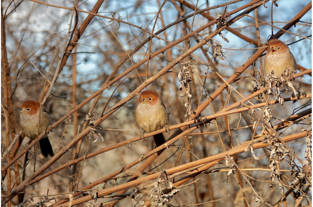
Eye-ringed Parrotbills