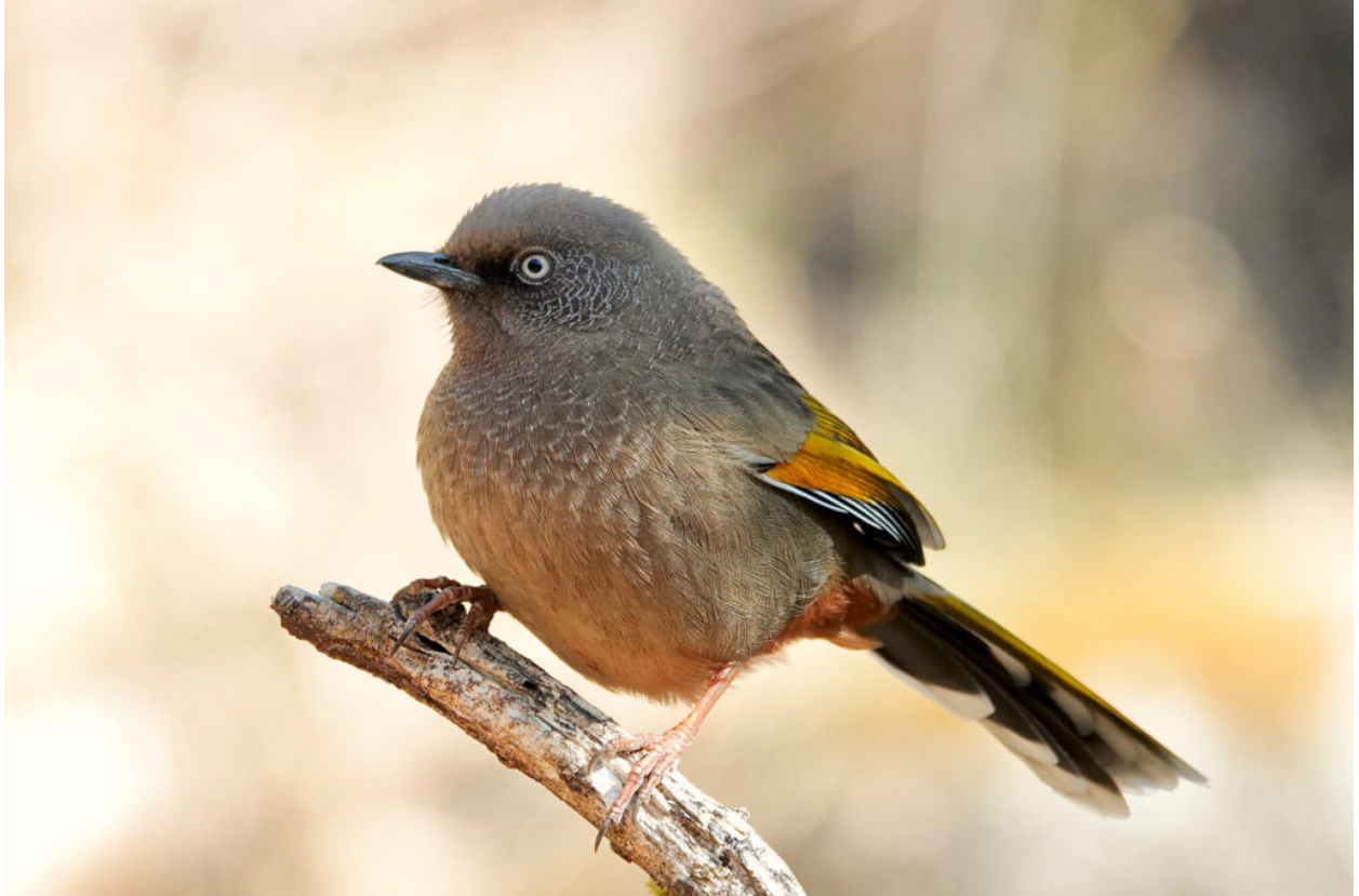
Elliot's Laughingthrush