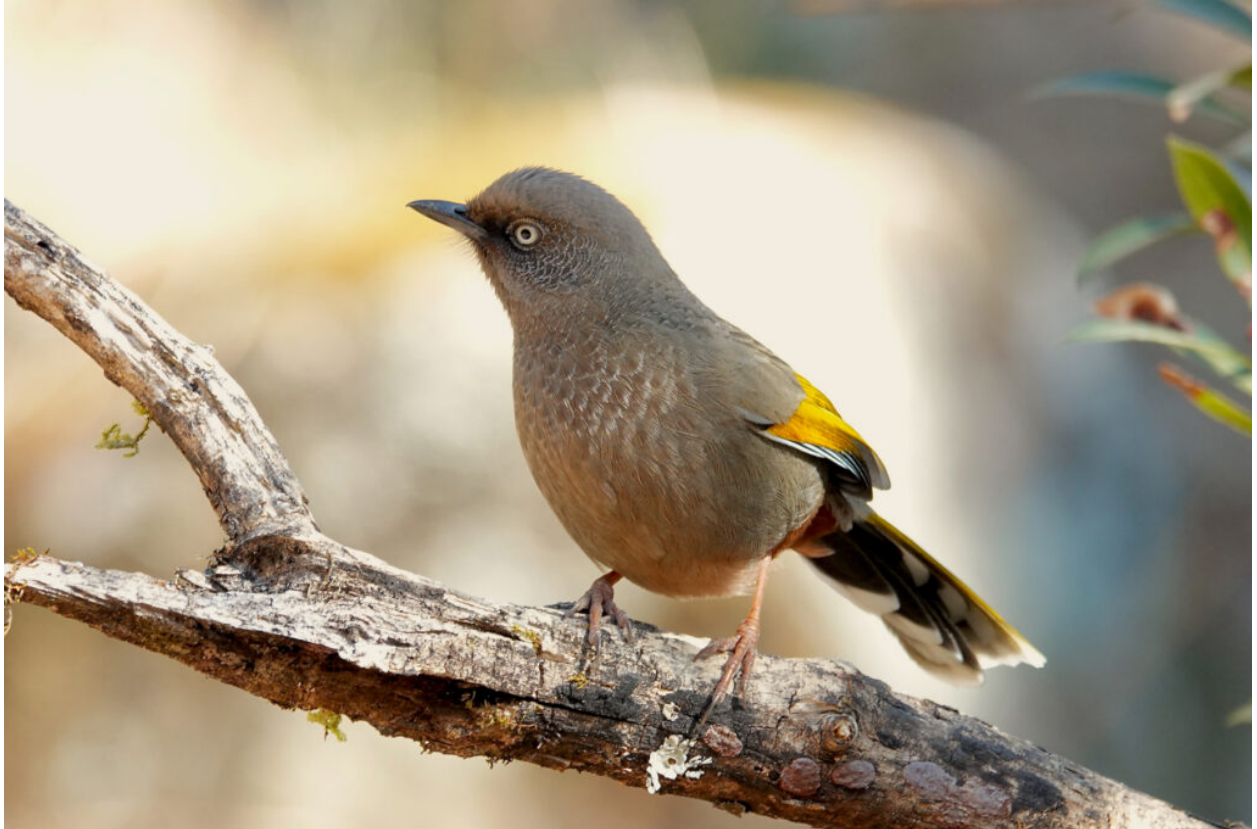
Elliot's Laughingthrush