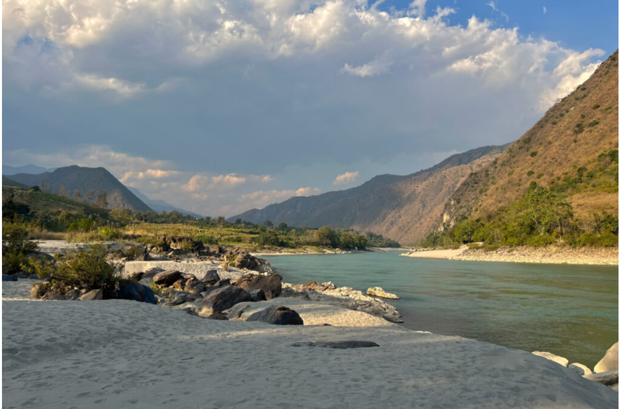
Salween River