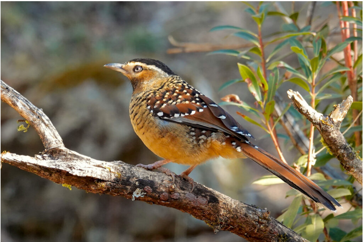
Spotted Laughingthrush