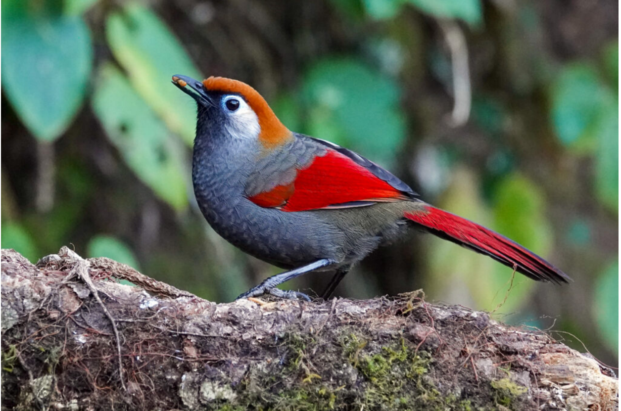
Red-tailed Laughingthrush