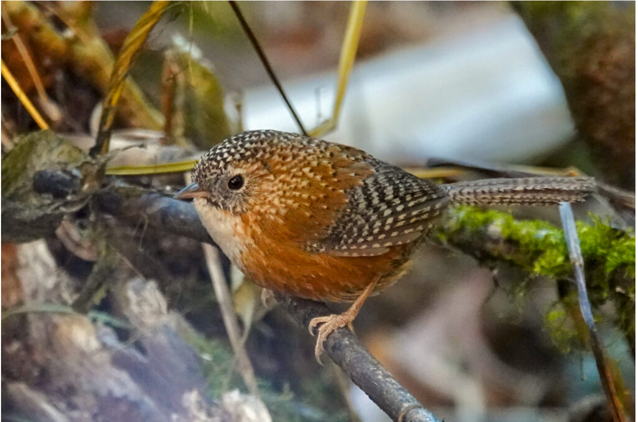
Bar-winged Wren-Babbler