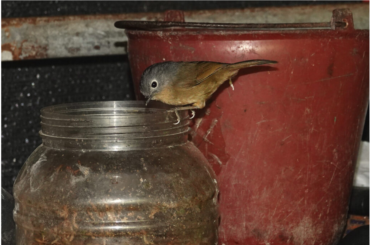
Yunnan Fulvetta