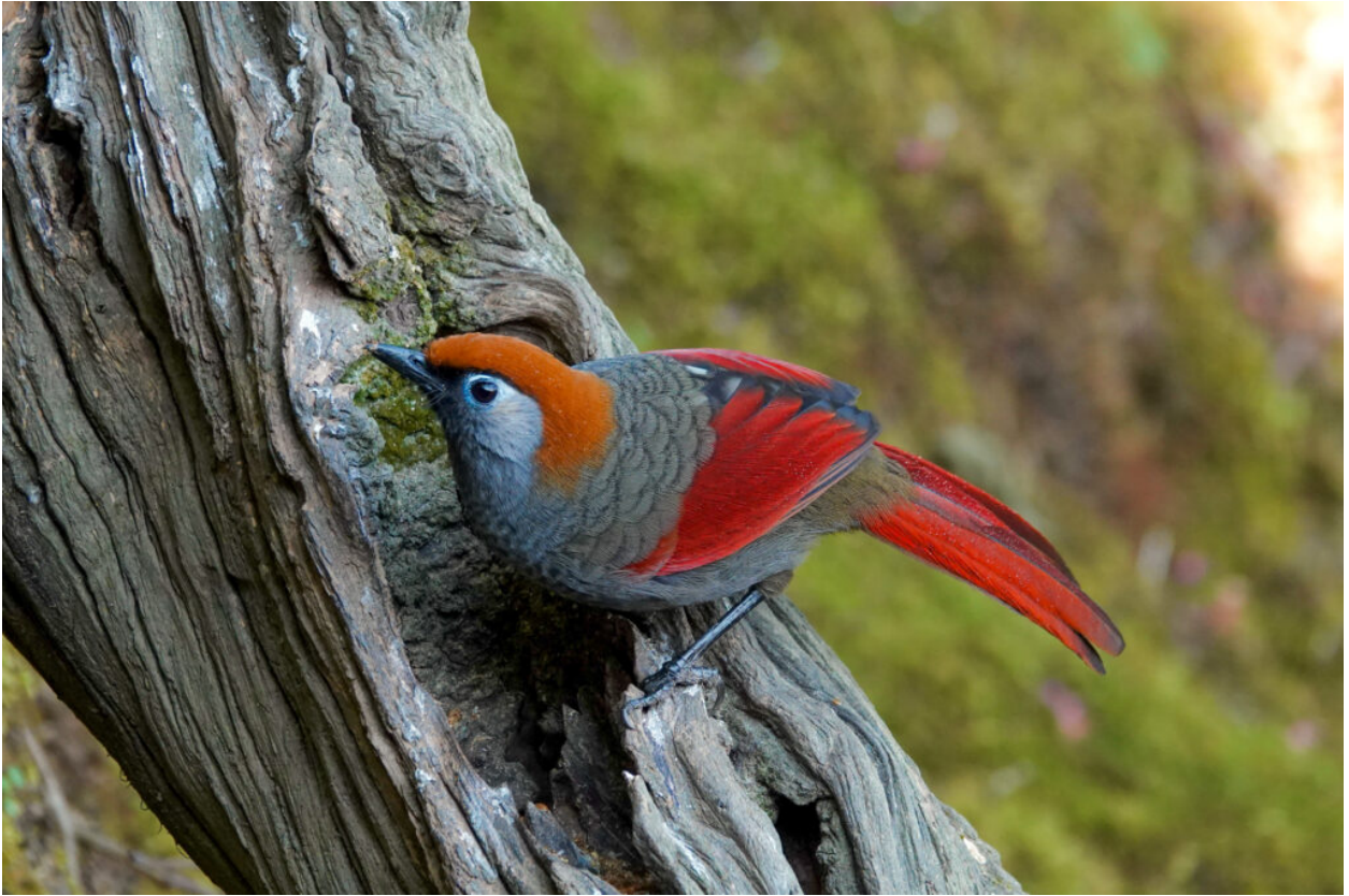
Red-tailed Laughingthrush