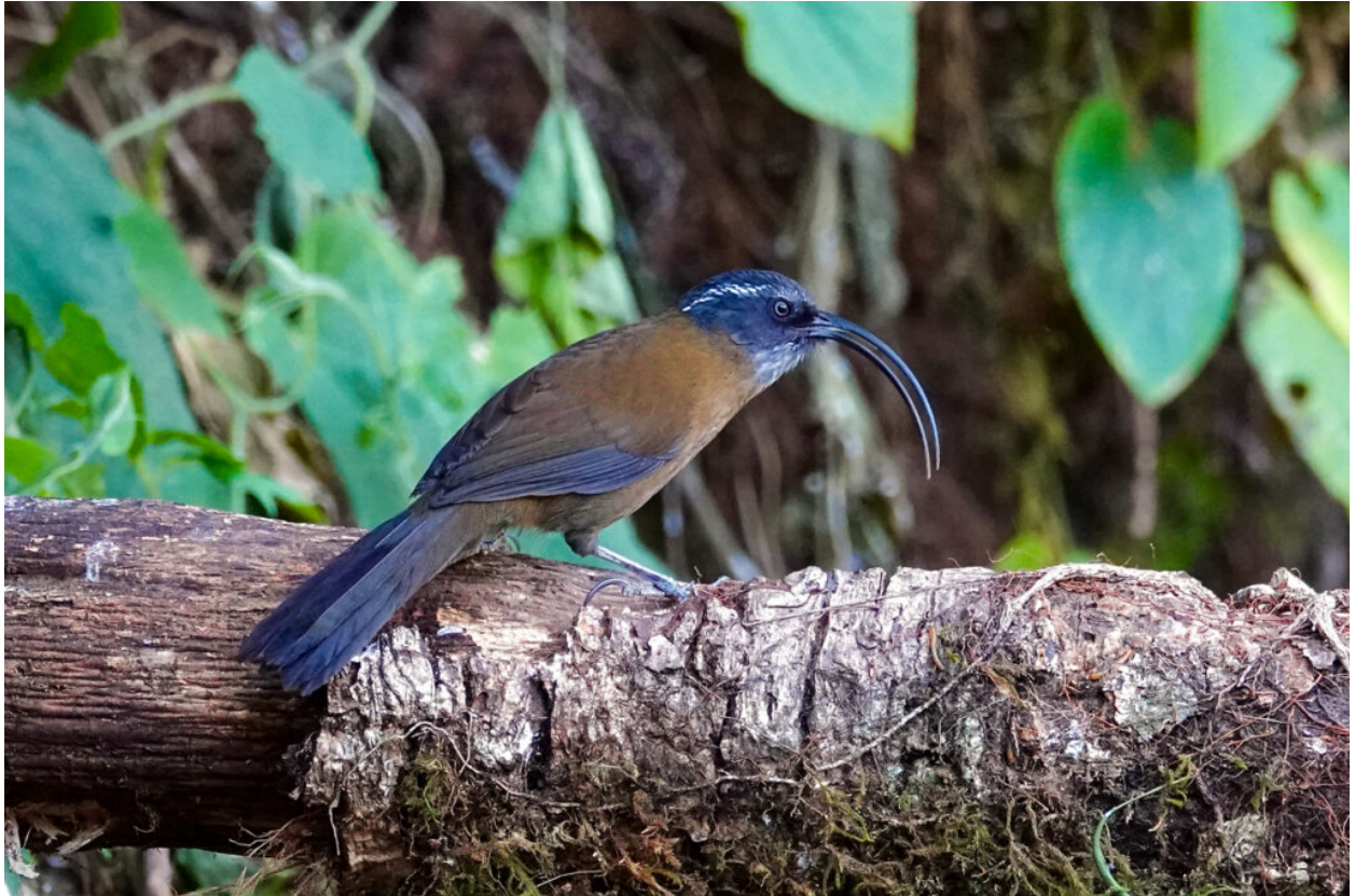
Slender-billed Scimitar Babbler