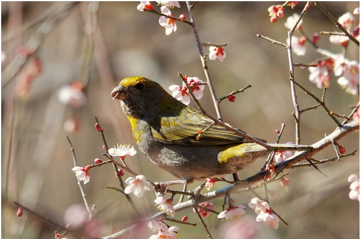
Crimson-browed Finch