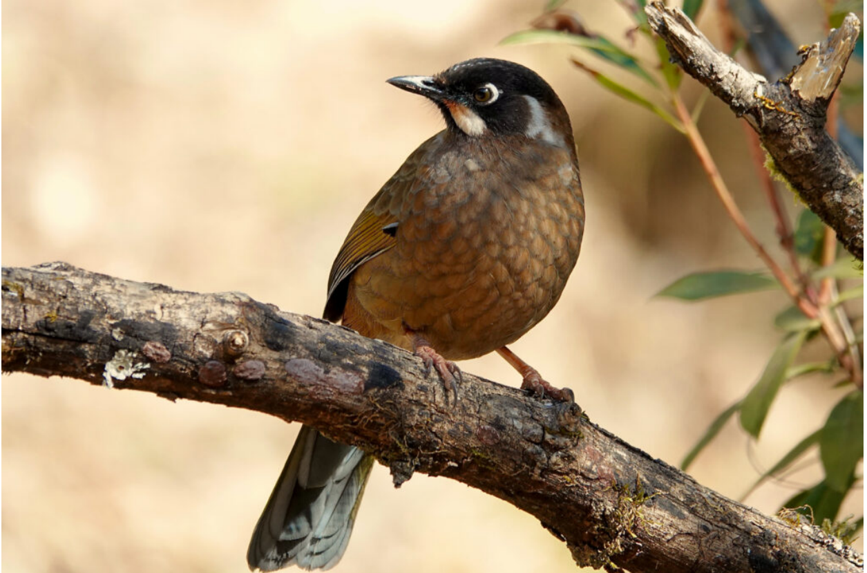
Black-faced Laughingthrush