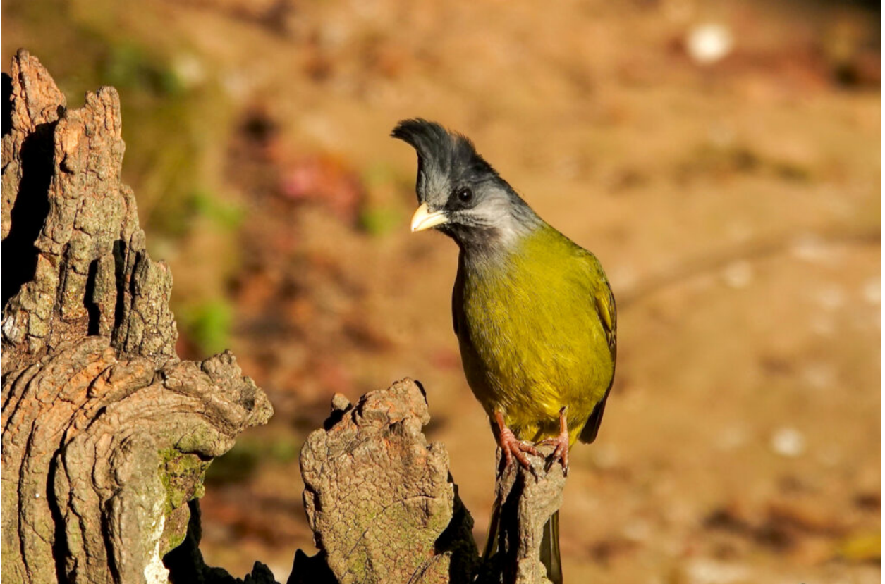
Crested Finchbill