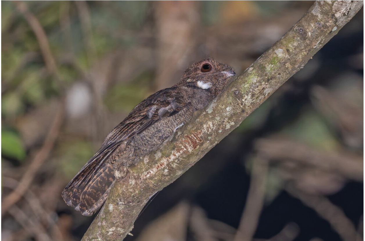
Brown Nightjar