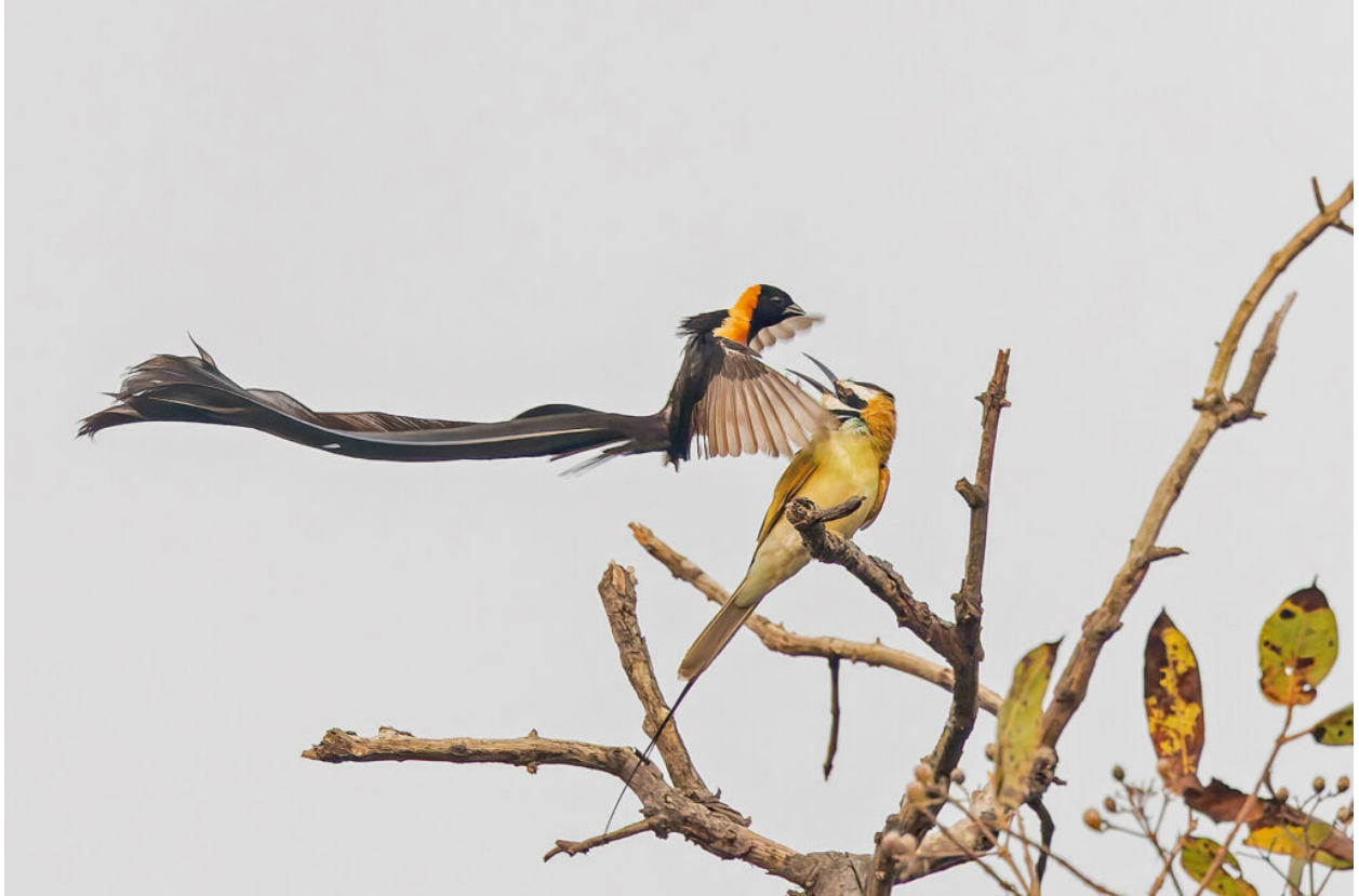
Togo Paradise Whydah and White-throated Bee-eater