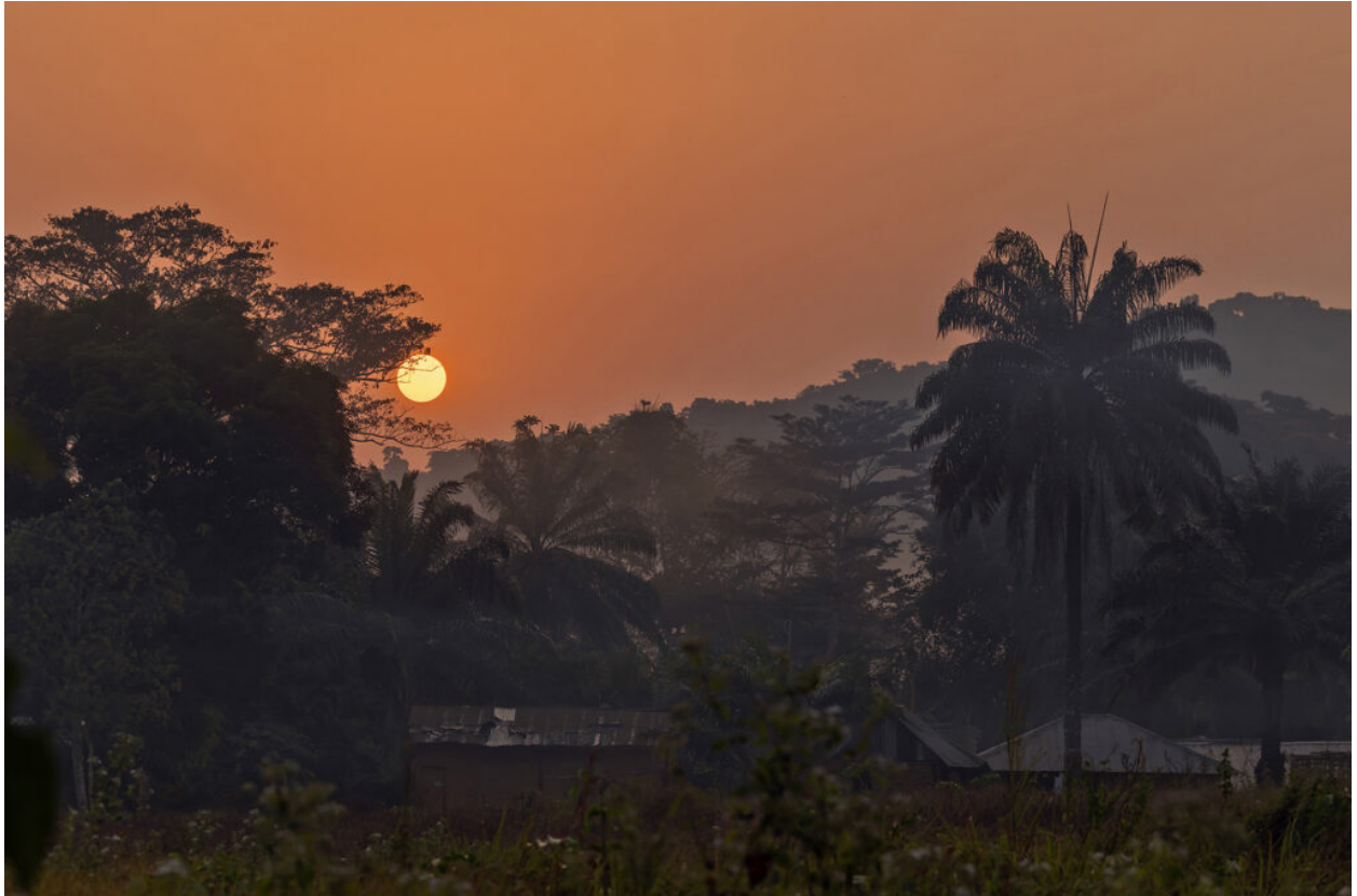
Gola Sunrise