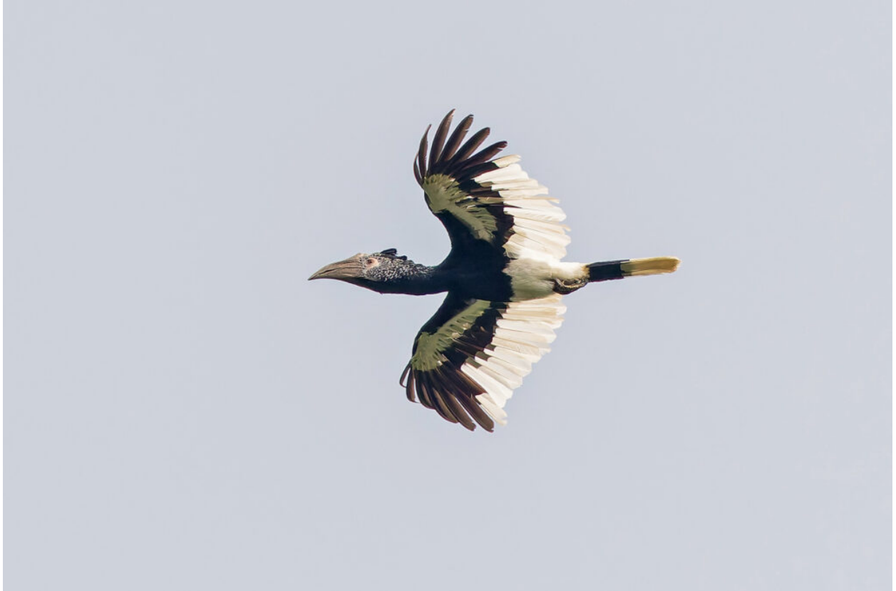
Black-and-white-casqued Hornbill