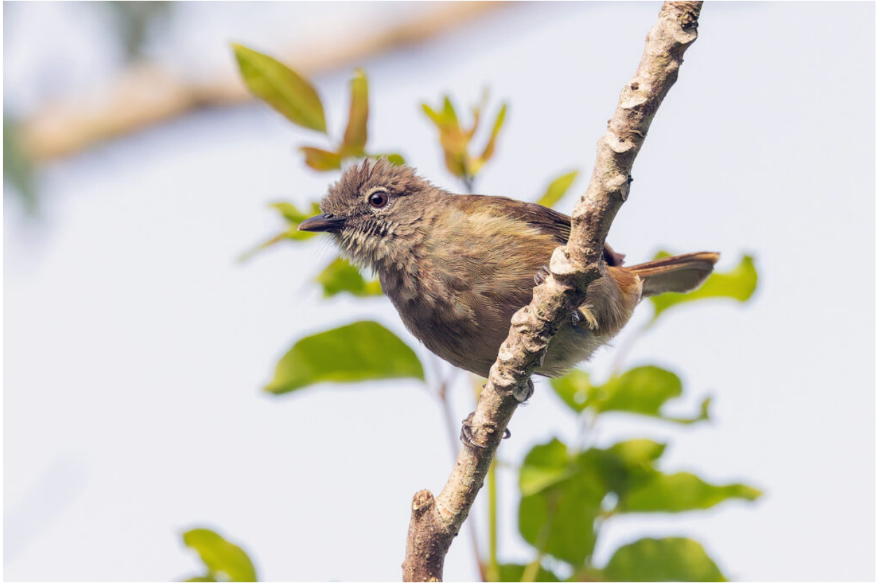
Ansorge's Greenbul