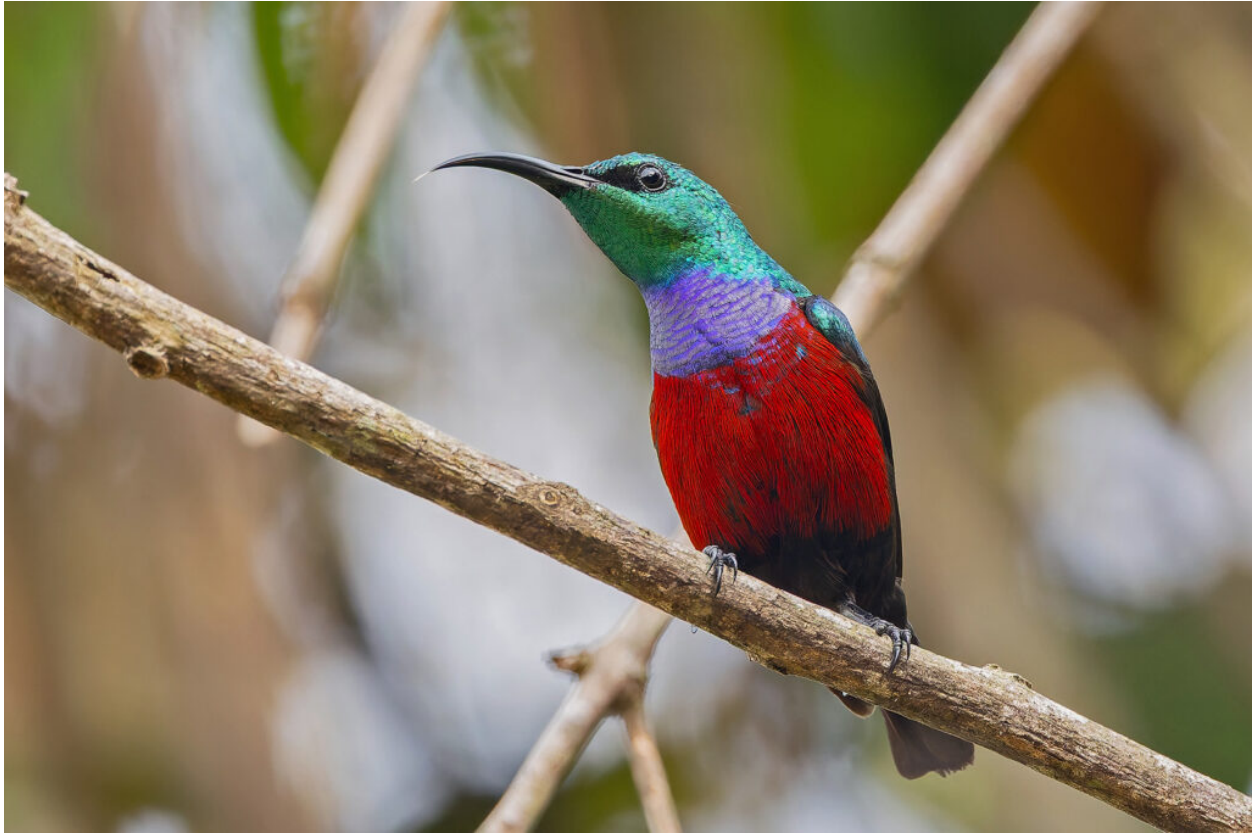
Johanna's Sunbird