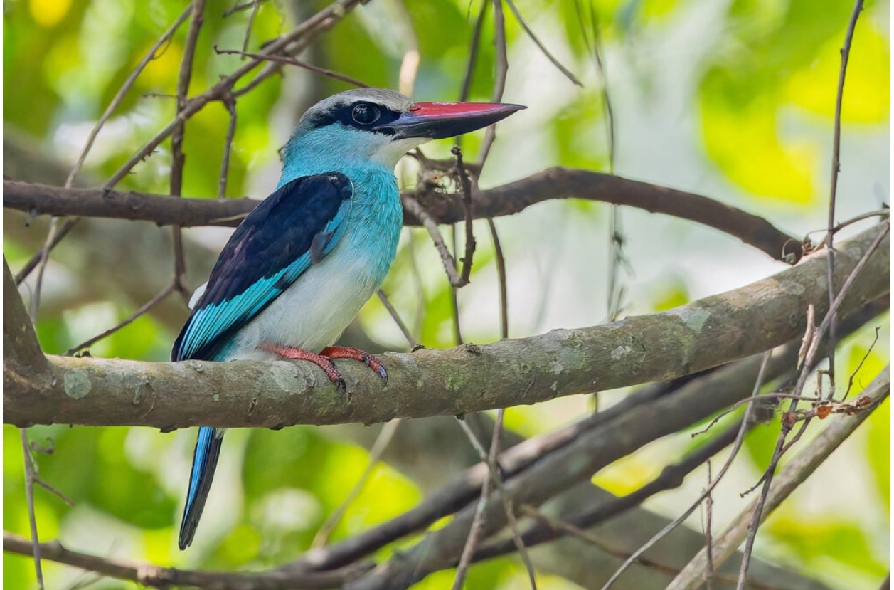
Blue-breasted Kingfisher