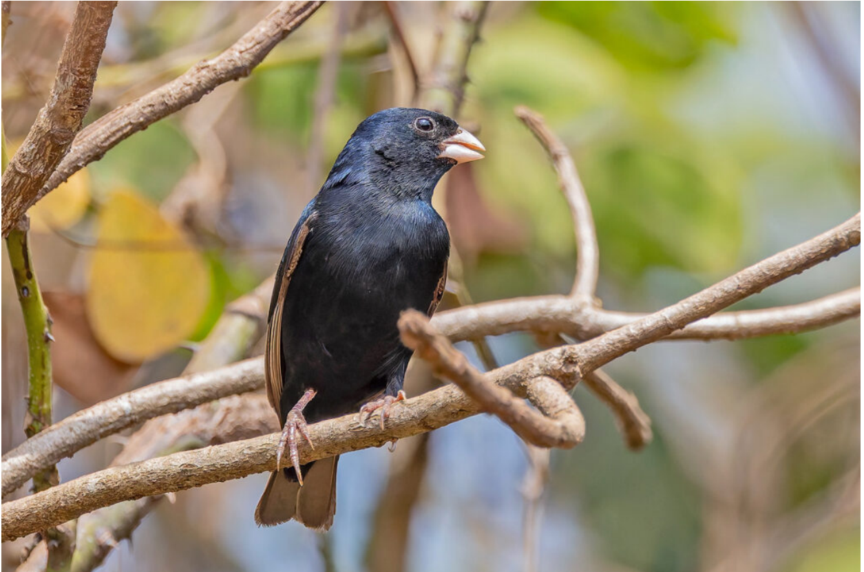
Cameroon Indigobird