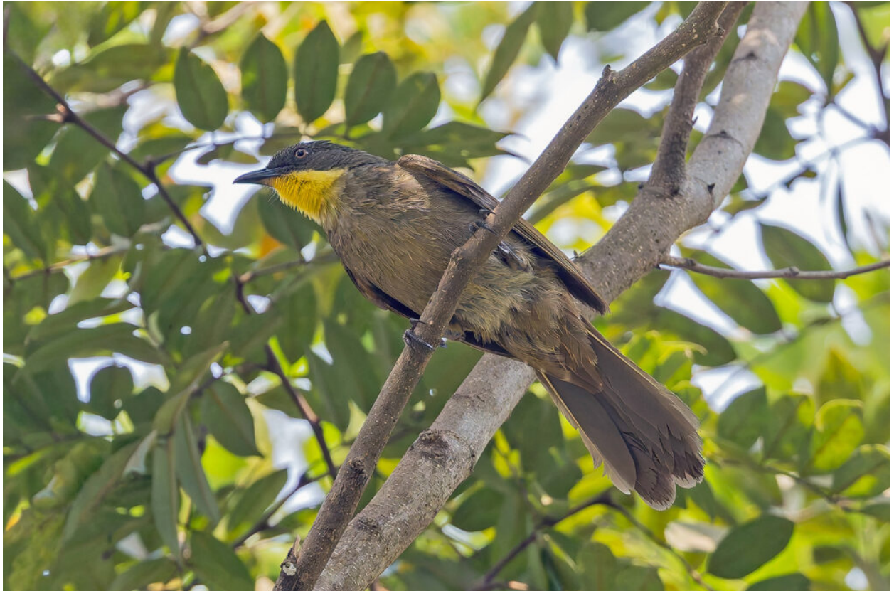
Yellow-gorgeted Greenbul