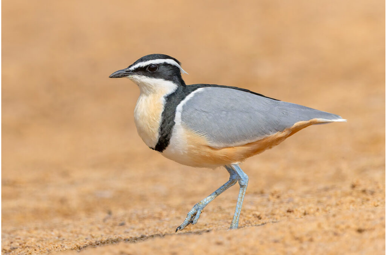
Egyptian Plover