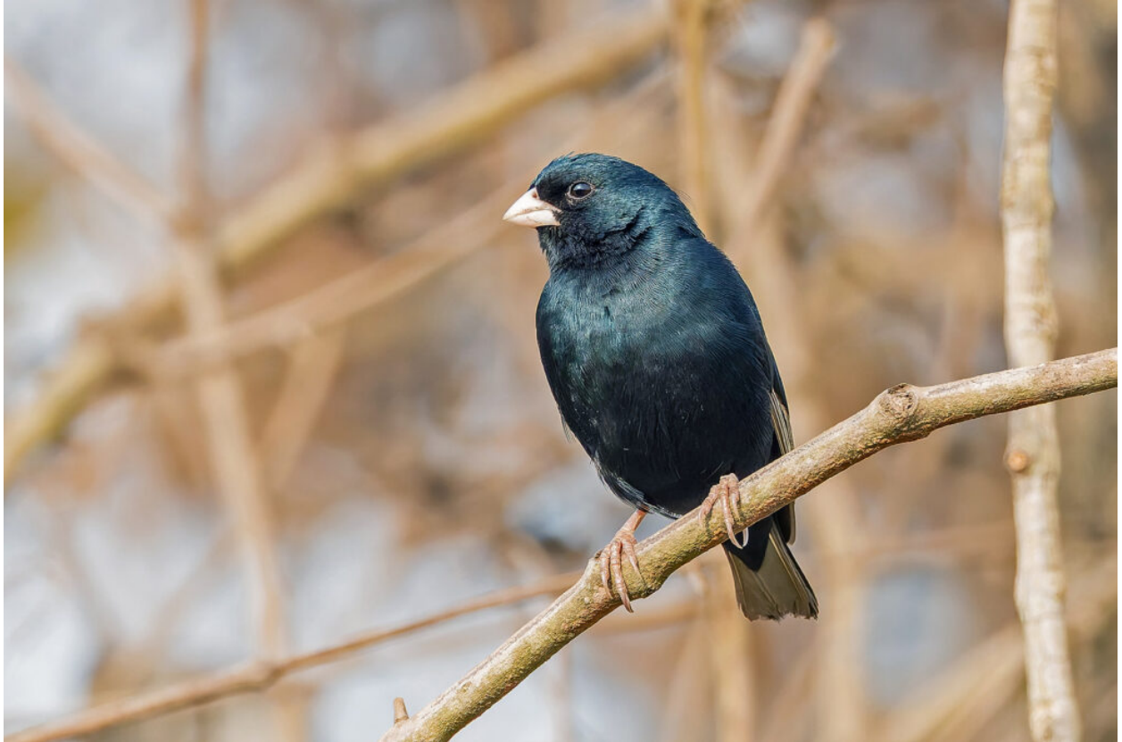
Jambandu Indigobird