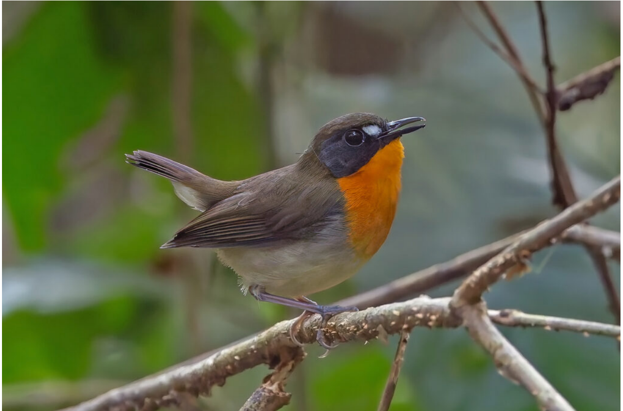
Orange-breasted Forest Robin