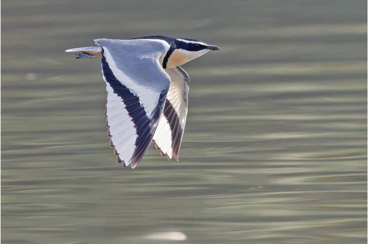
Egyptian Plover