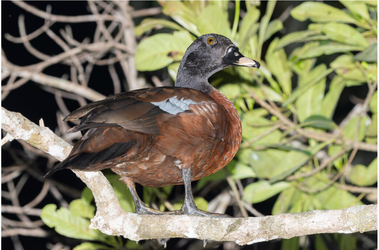
Hartlaub's Duck