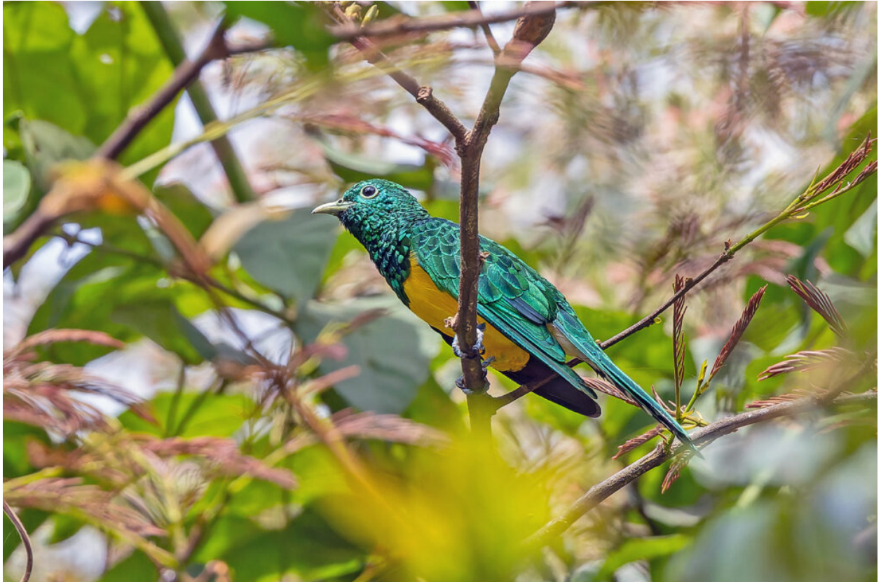
African Emerald Cuckoo