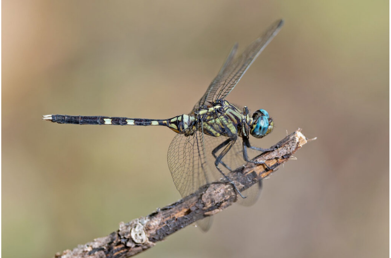
Tiwai Dragonfly