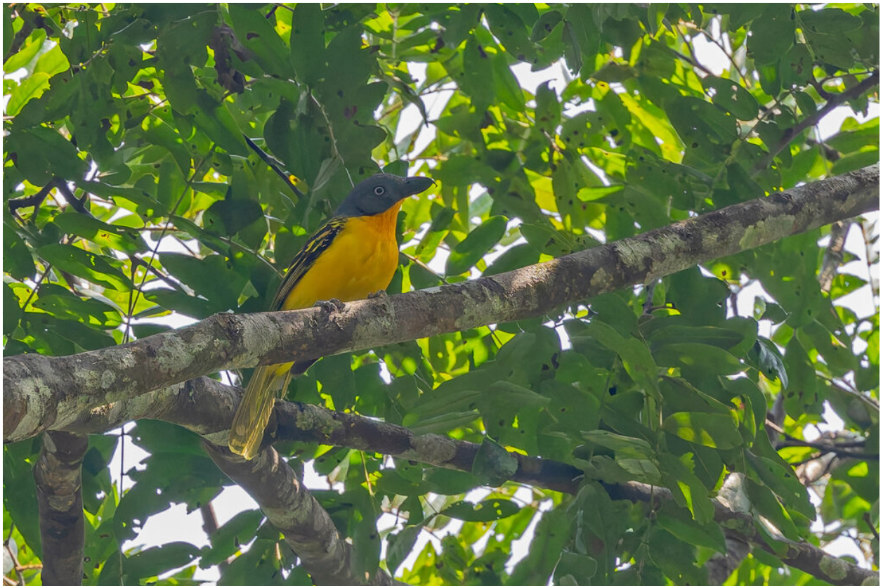
Lagden's Bushshrike (Western)