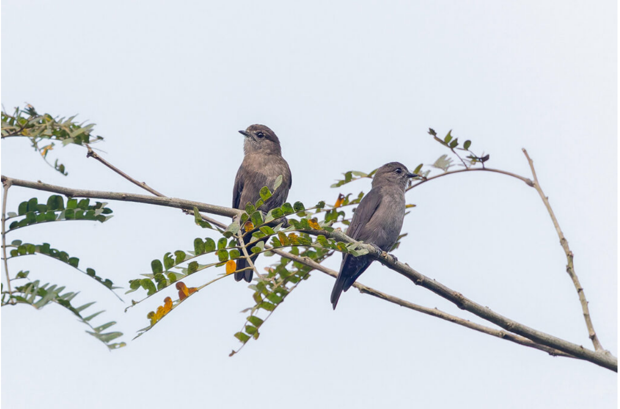
Ussher's Flycatchers