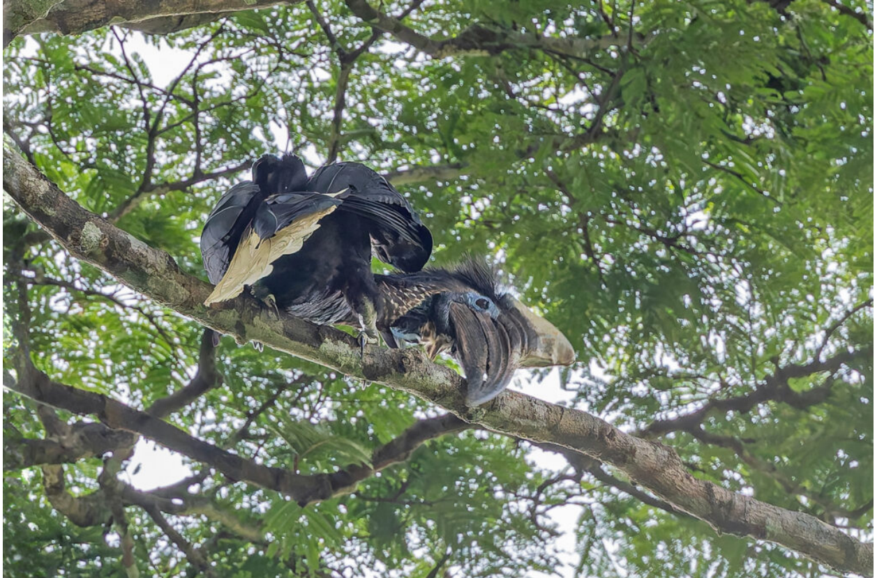
Yellow-casqued Hornbill