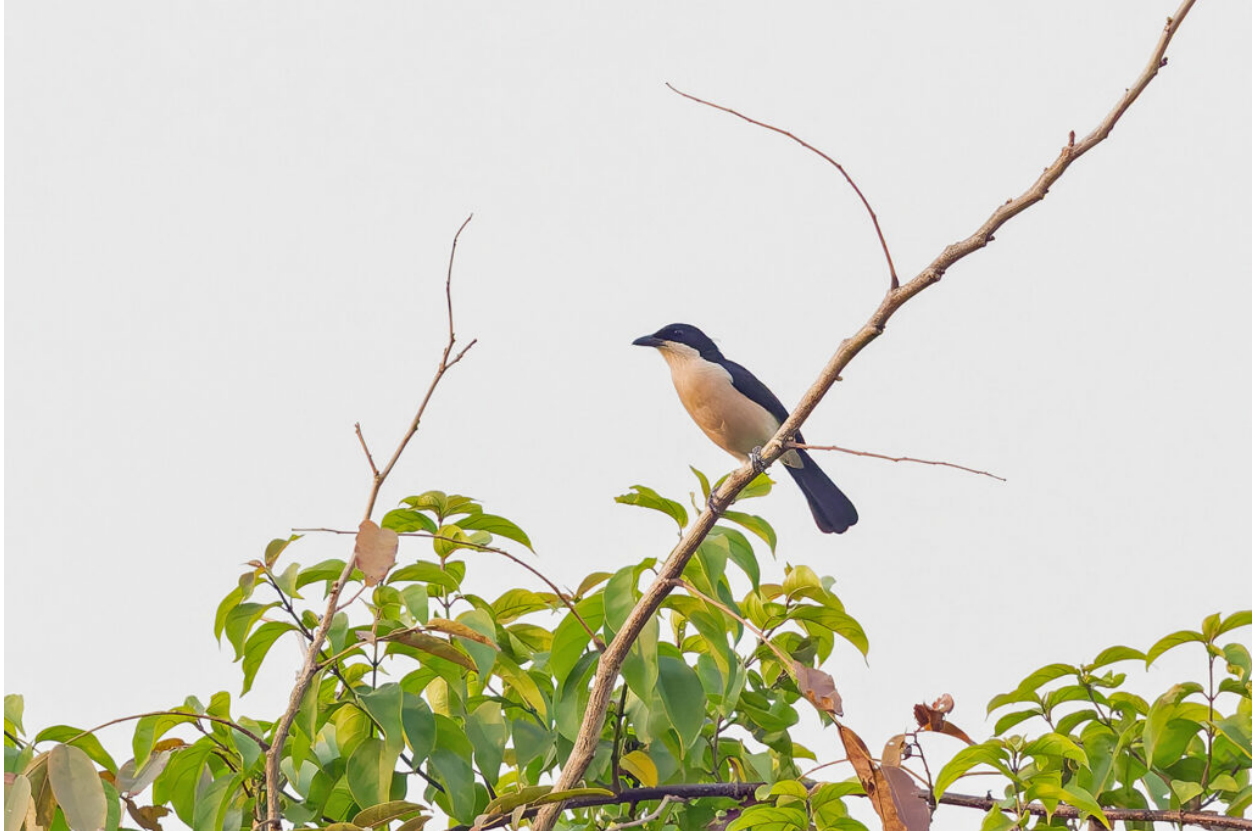
Turati's Boubou