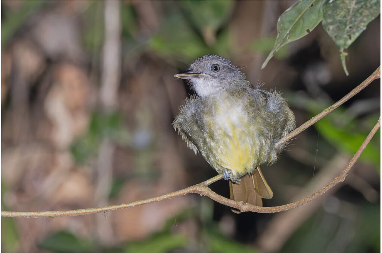
White-throated Greenbul