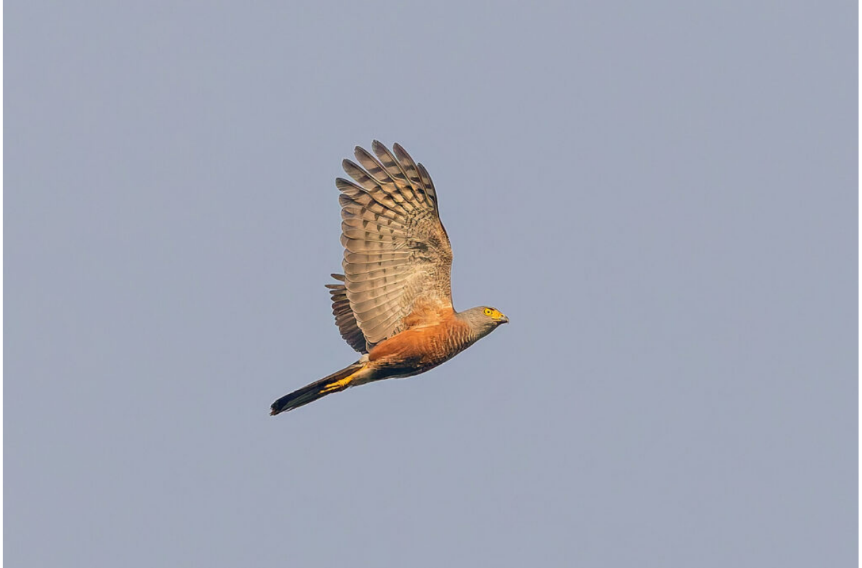
African Goshawk (Red Chested)