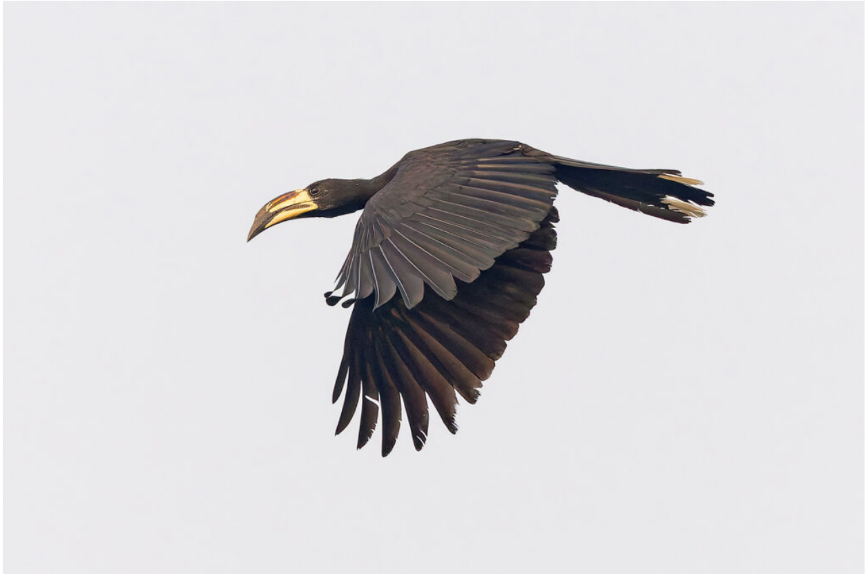
West African Pied Hornbill