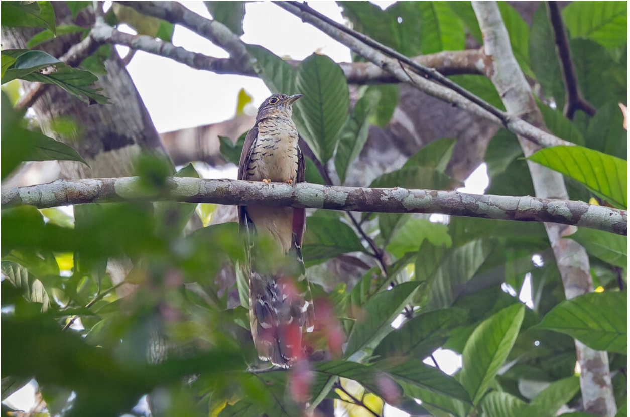
Olive Long-tailed Cuckoo