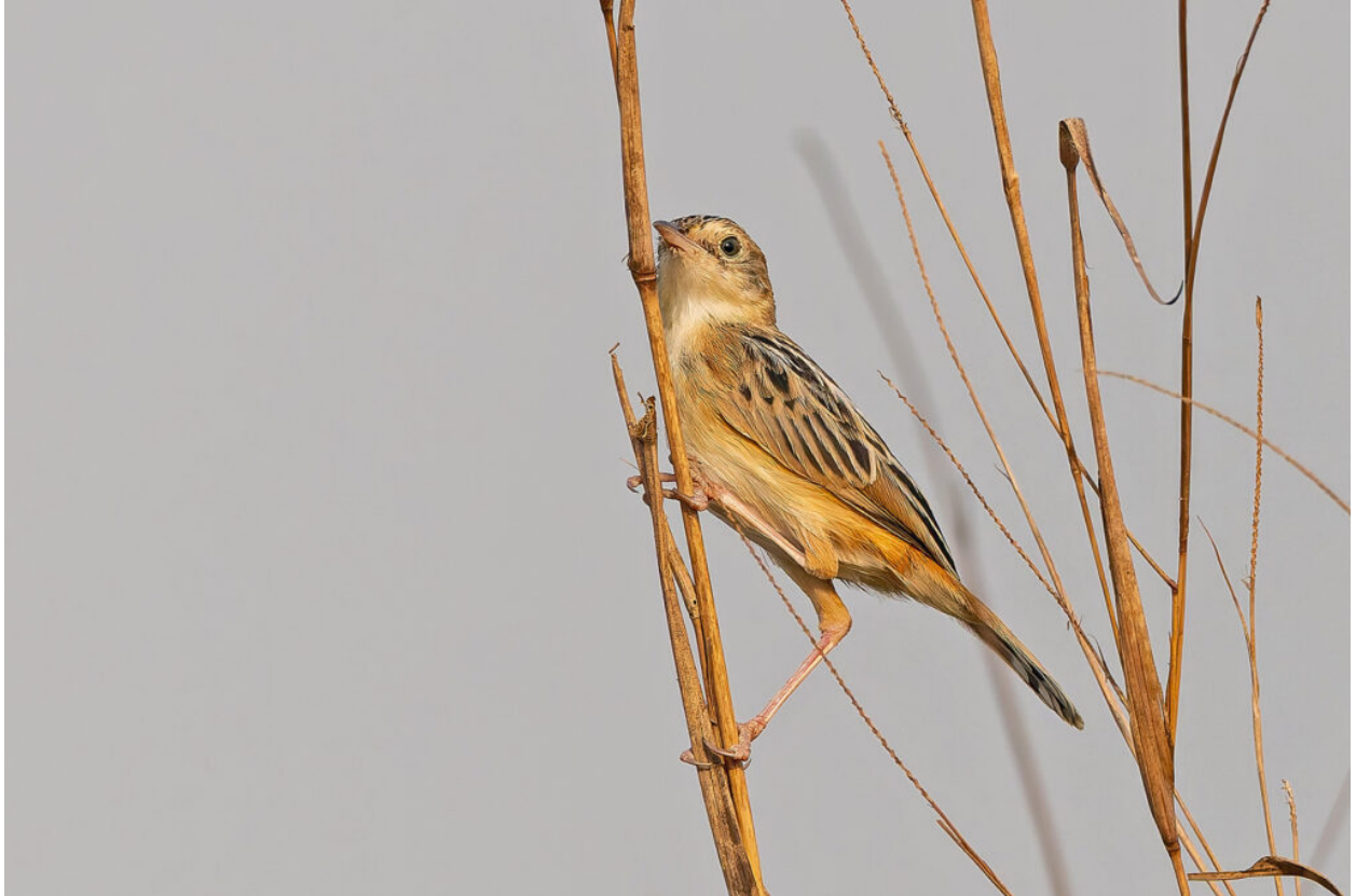
Black-backed Cisticola