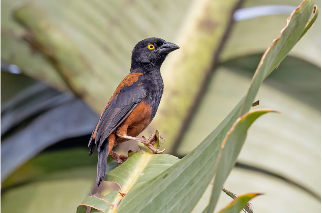
Chestnut-and-Black Weaver