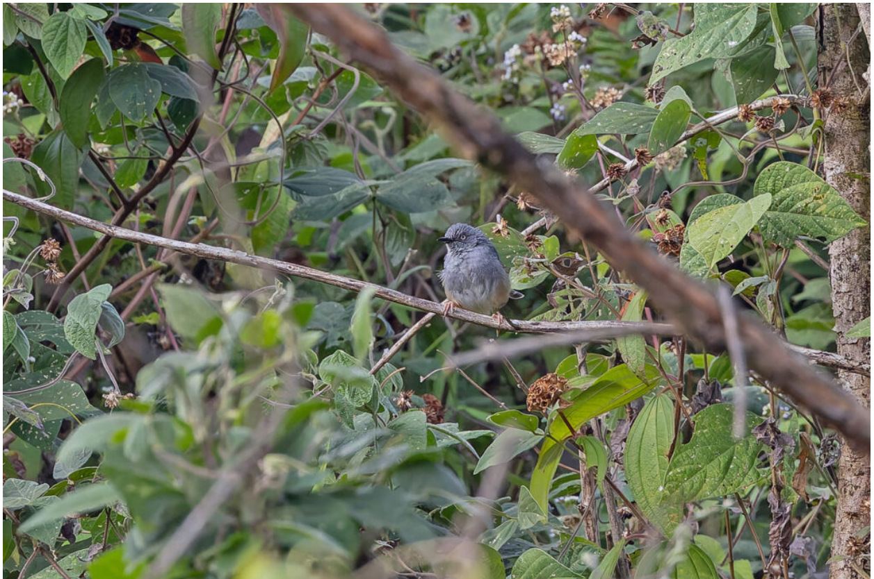
Sierra Leone Prinia