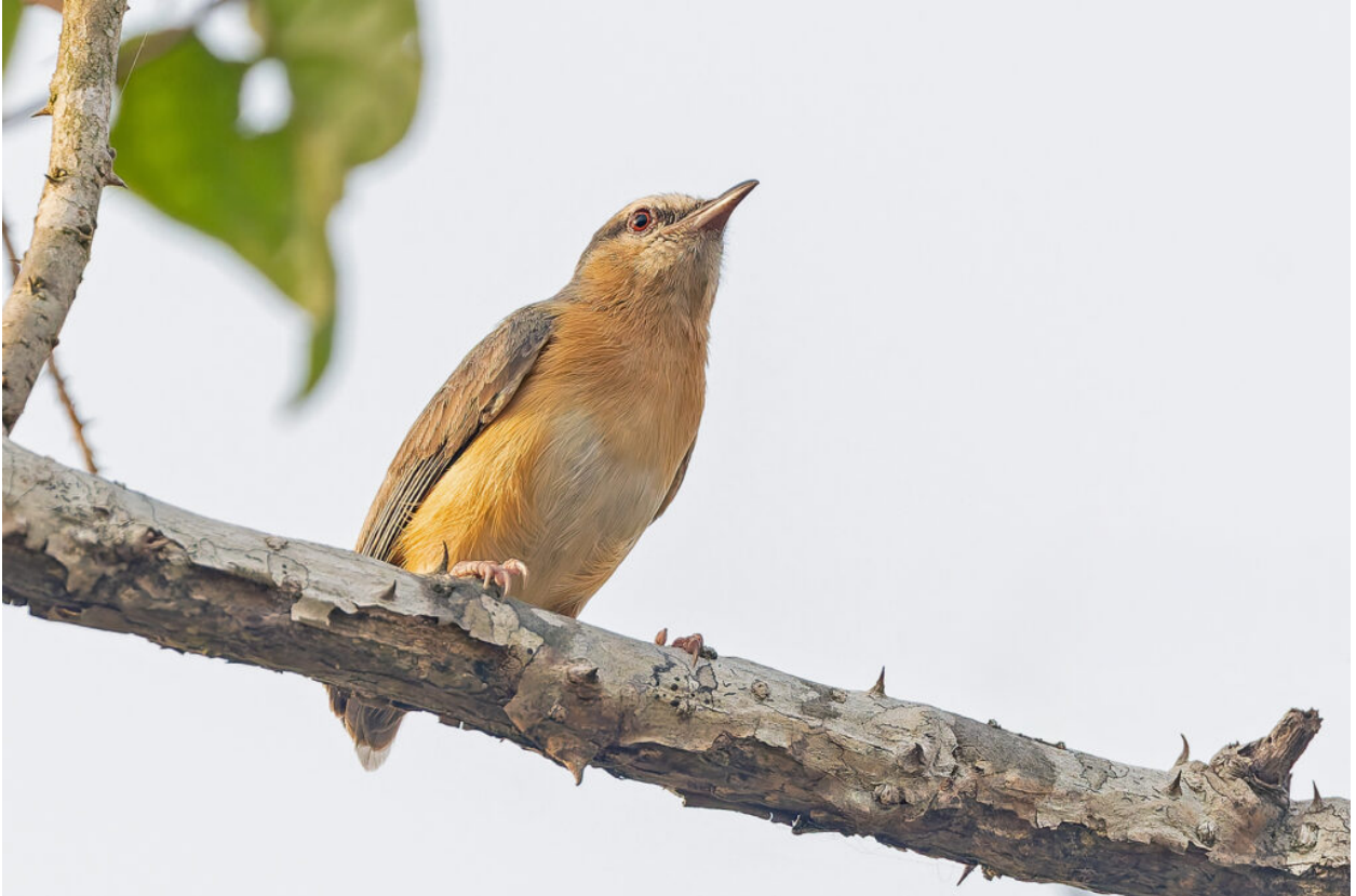
Northern Crombec