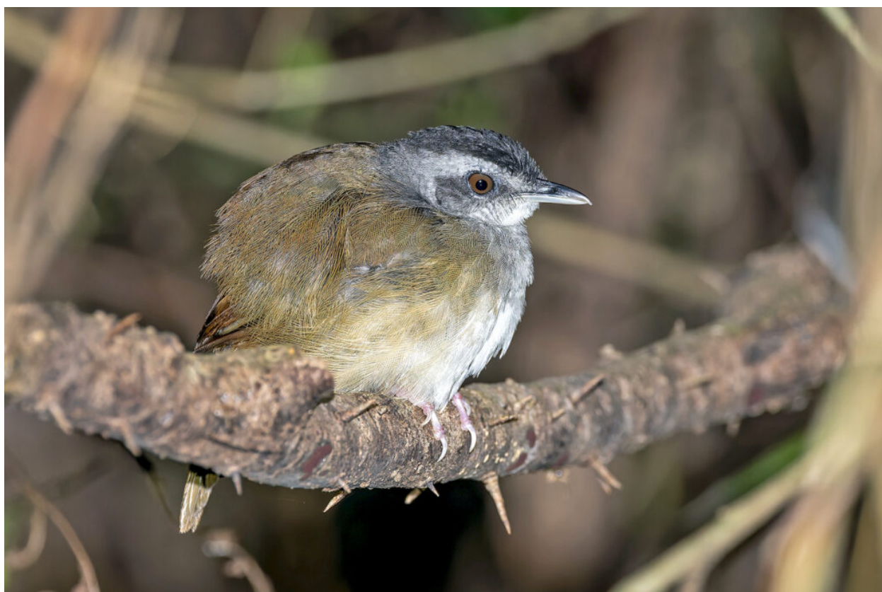
Blackcap Illadopsis