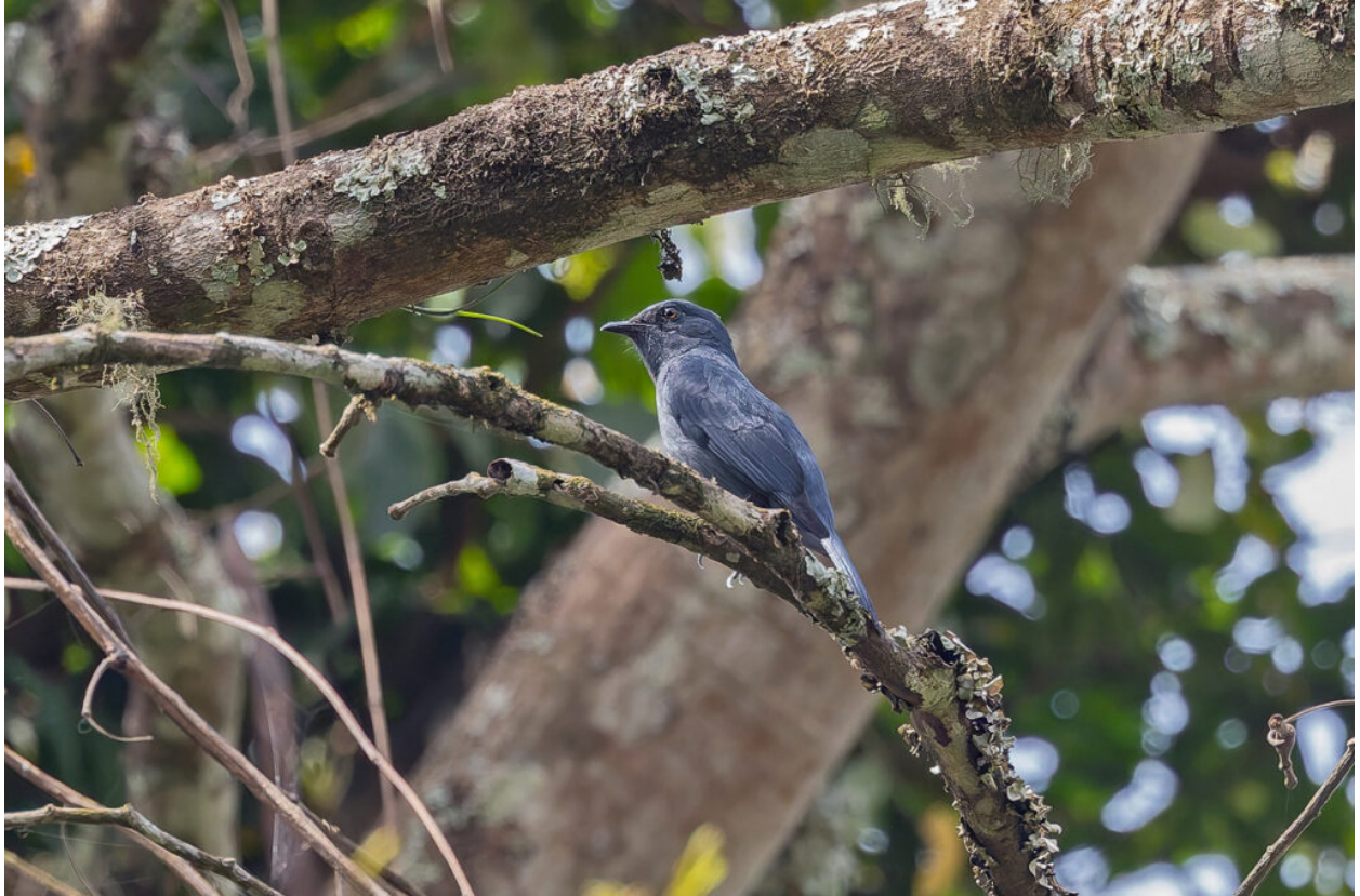
Nimba Flycatcher