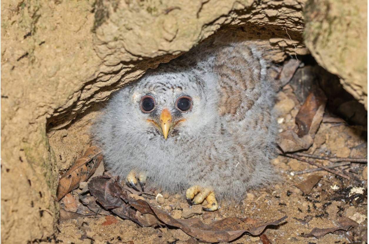
African Wood Owl