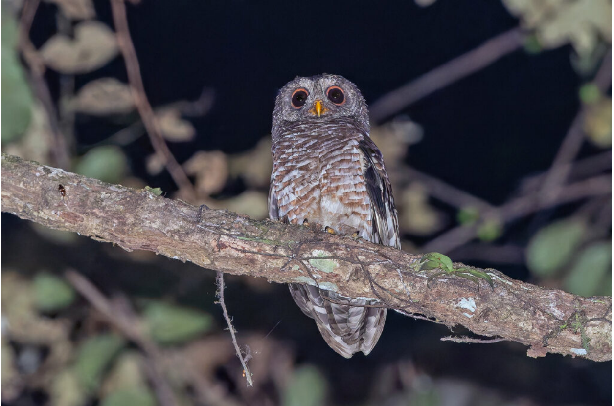
African Wood Owl