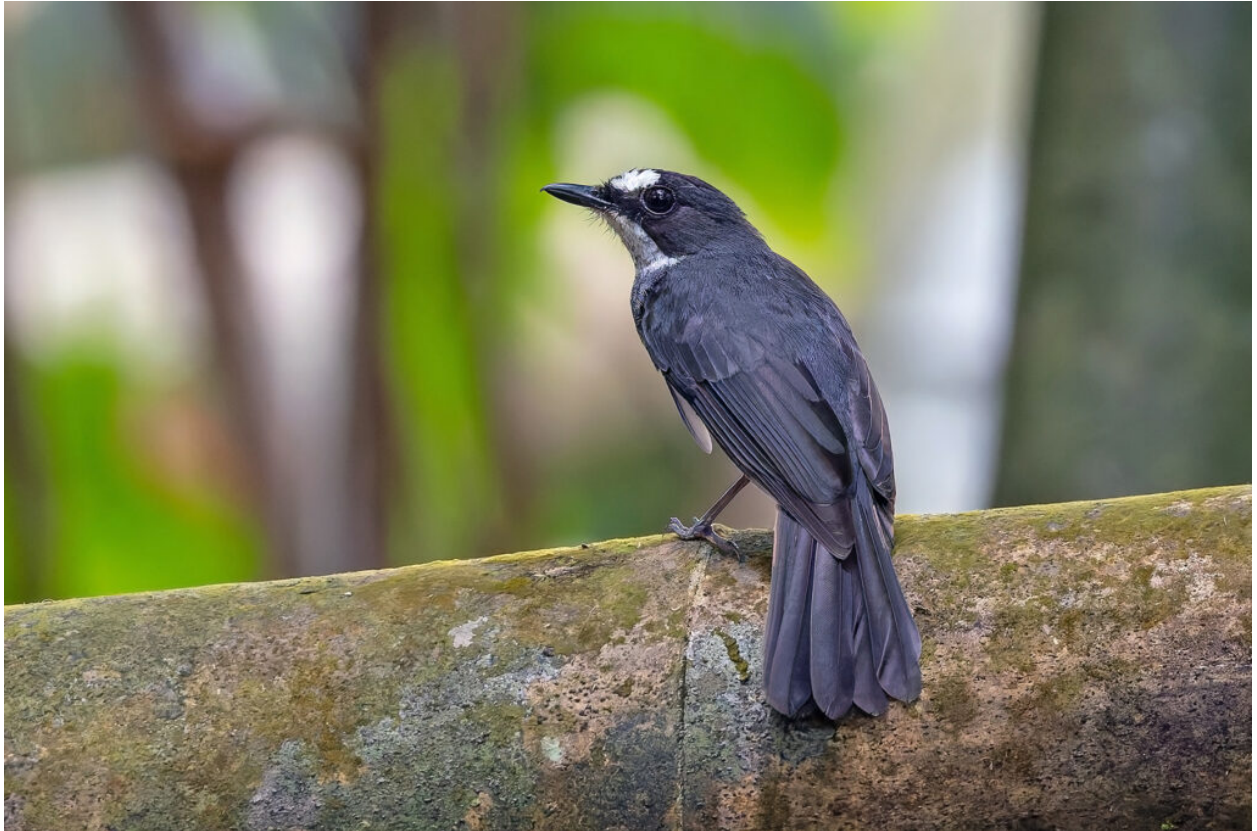
White-browed Forest Flycatcher