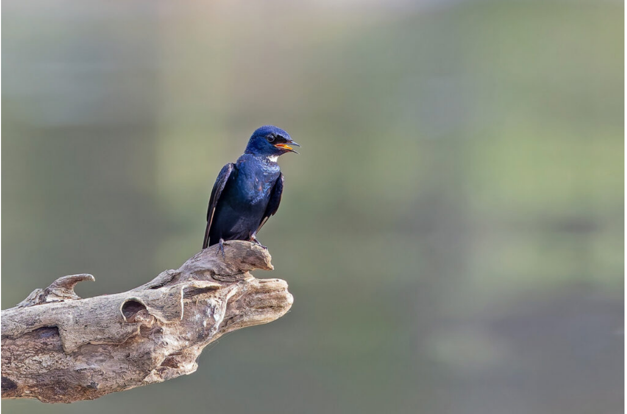
White-bibbed Swallow