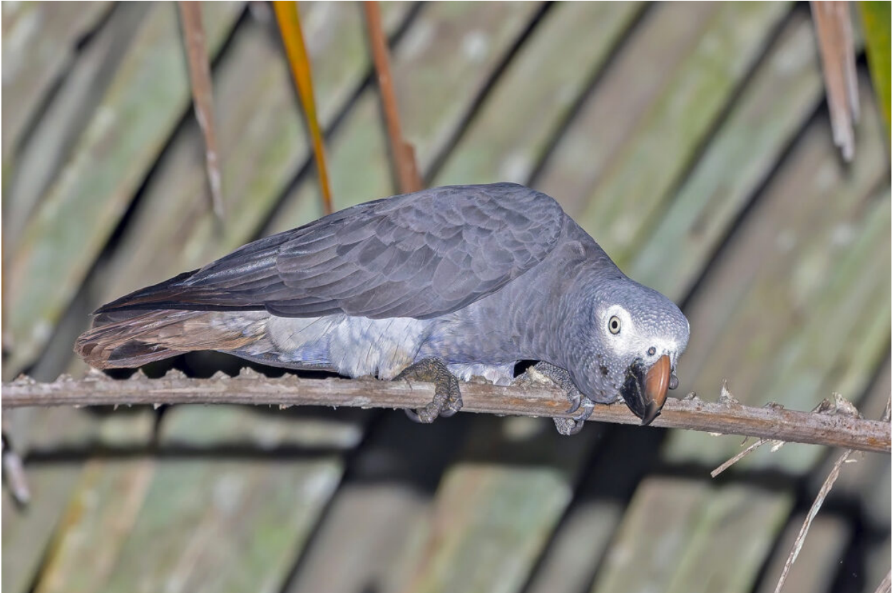
Timneh Parrot