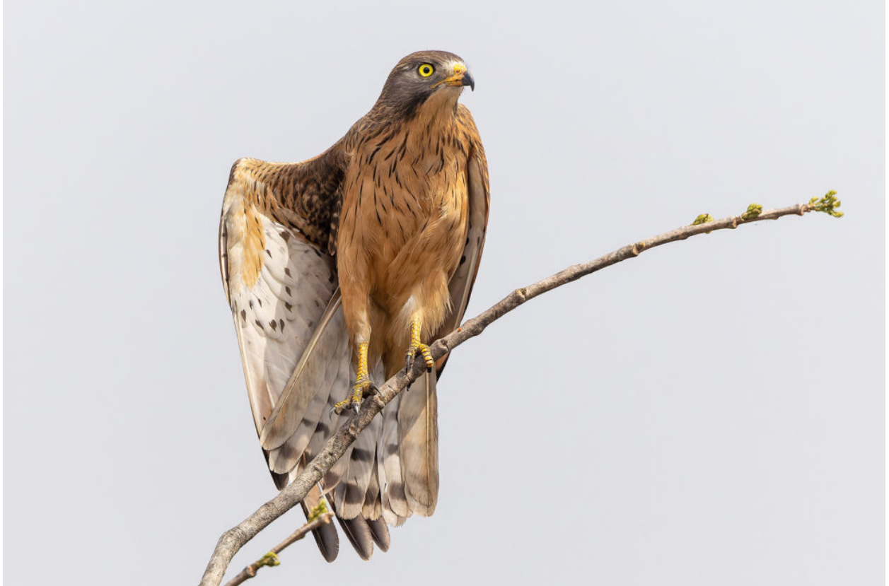
Grasshopper Buzzard