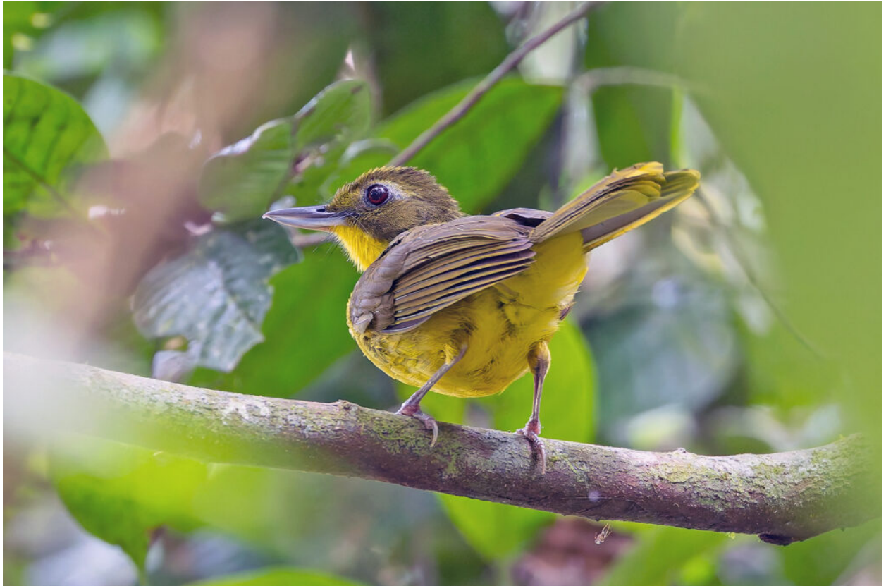
Green-tailed Bristlebill