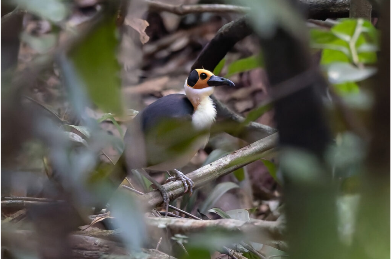
White-necked Rockfowl