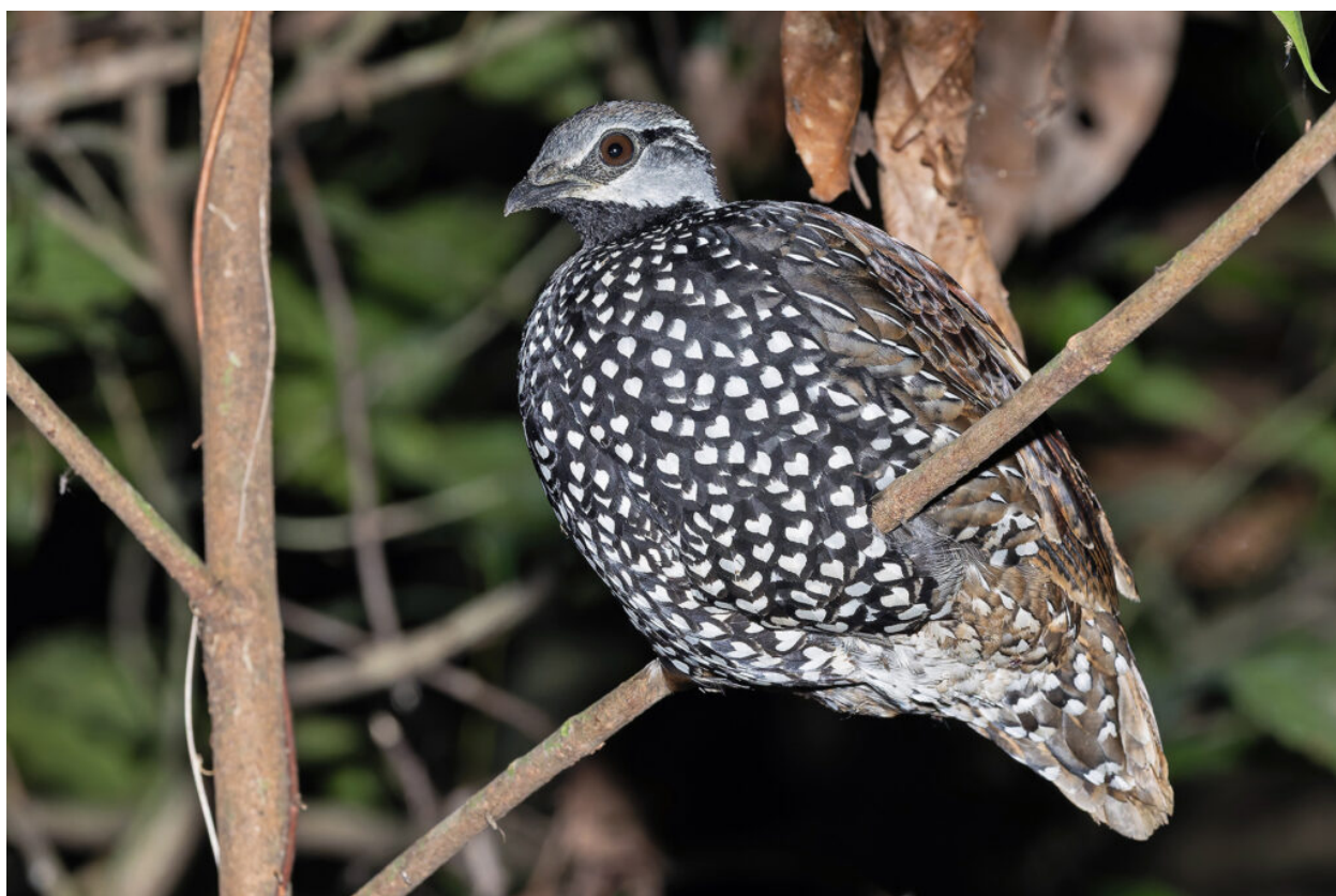
Latham's Francolin