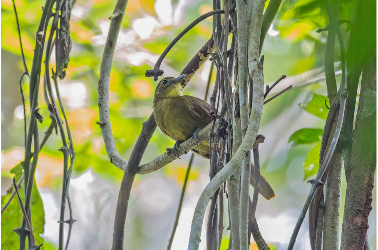
Yellow-bearded Greenbul