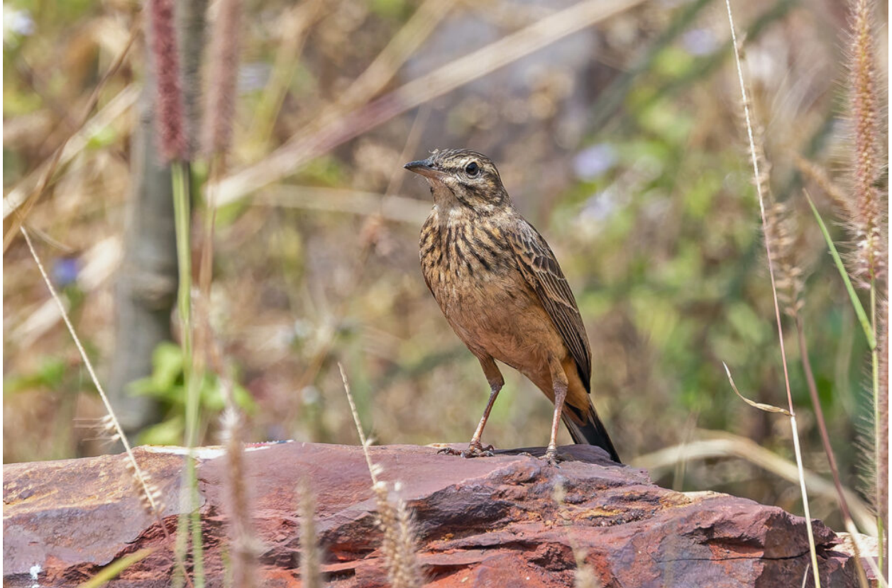
Long-billed Pipit (Bannerman's)