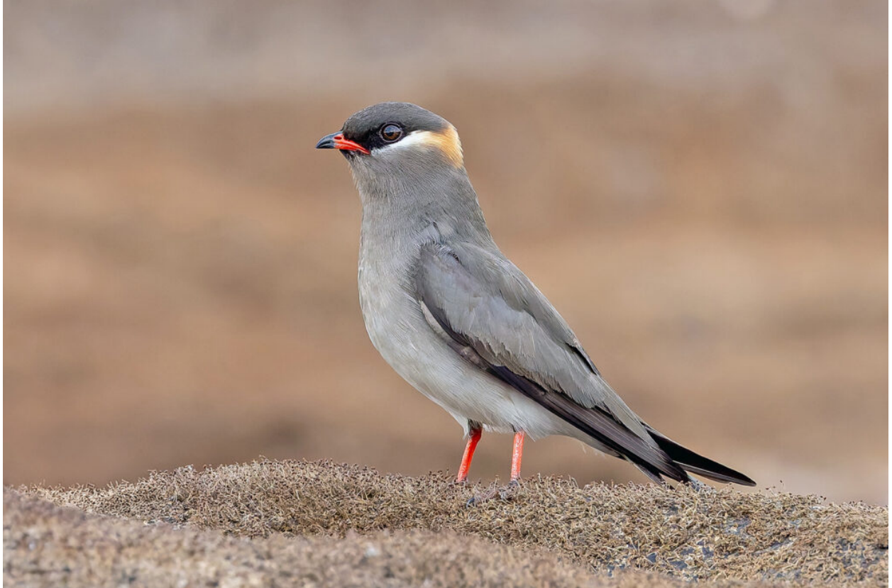
Rock Pratincole