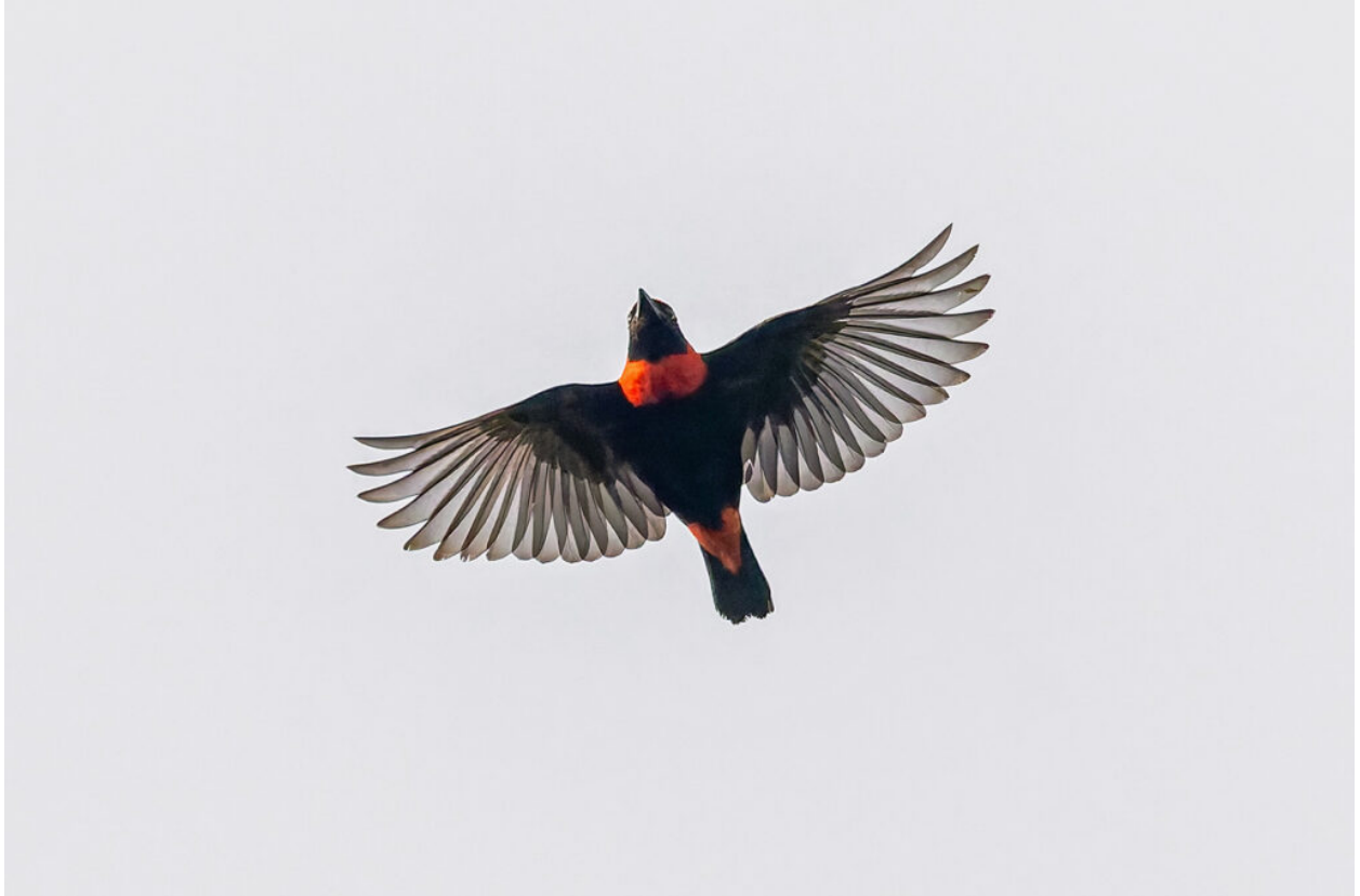
Red-vented Malimbe