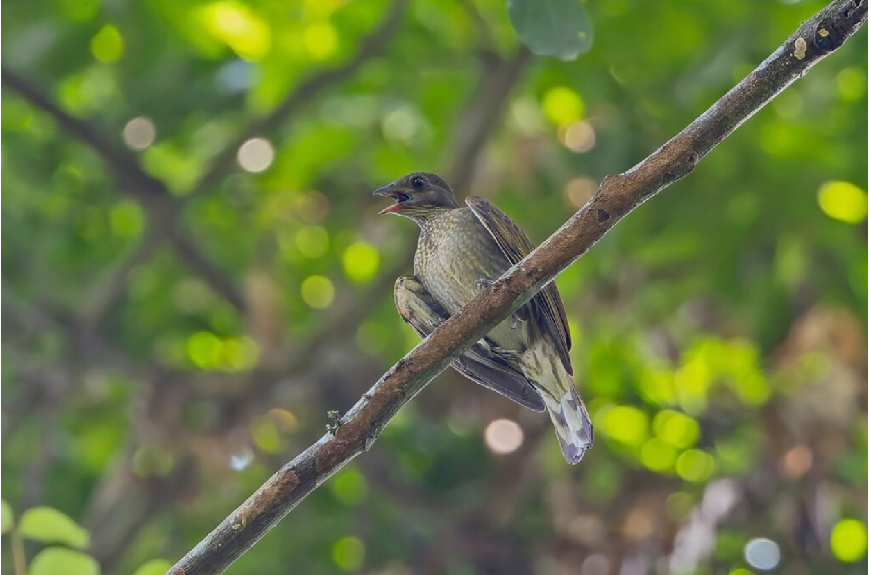
Spotted Honeyguide