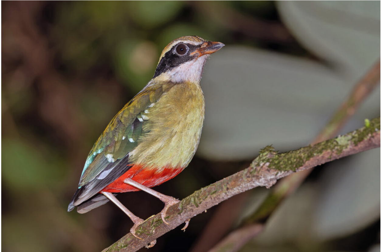
African Pitta (West African Pulih)