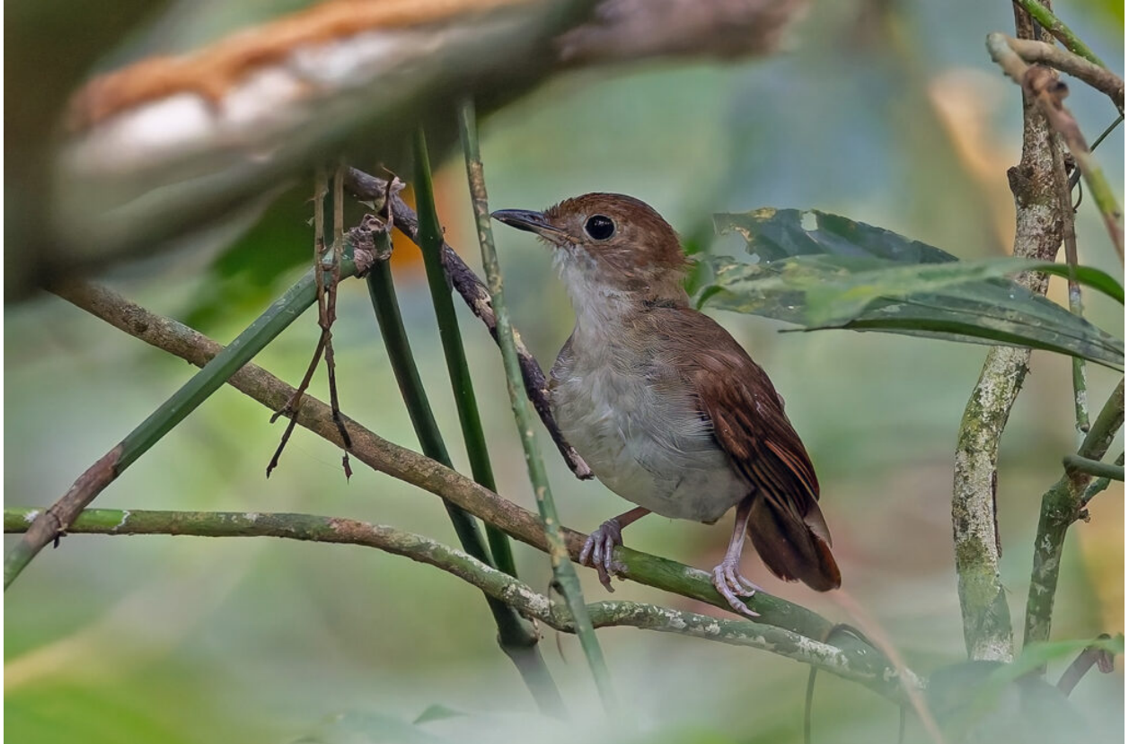
Rufous-winged Illadopsis