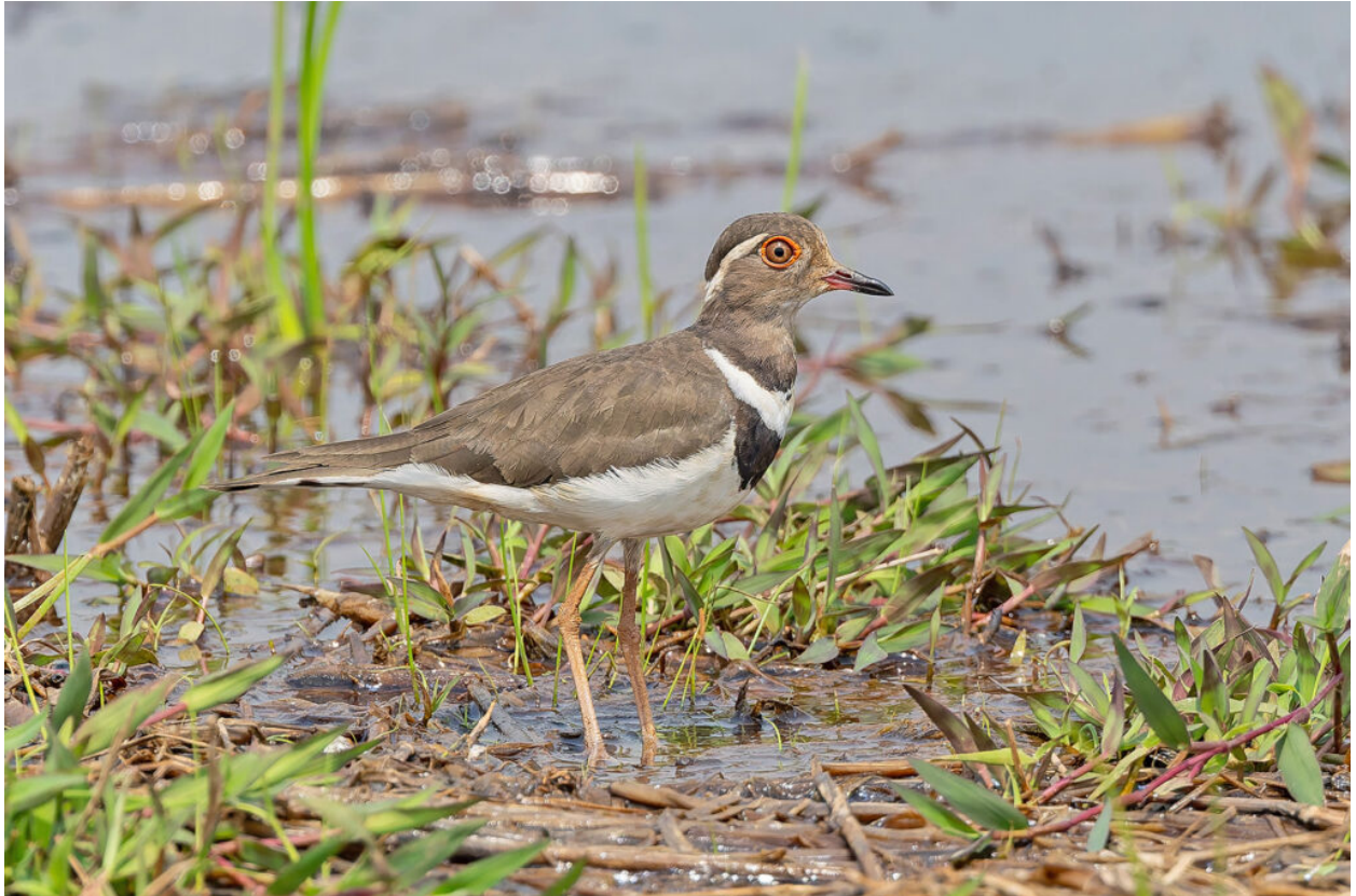
Forbes's Plover