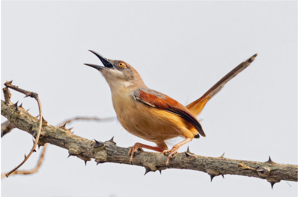
Red-winged Prinia