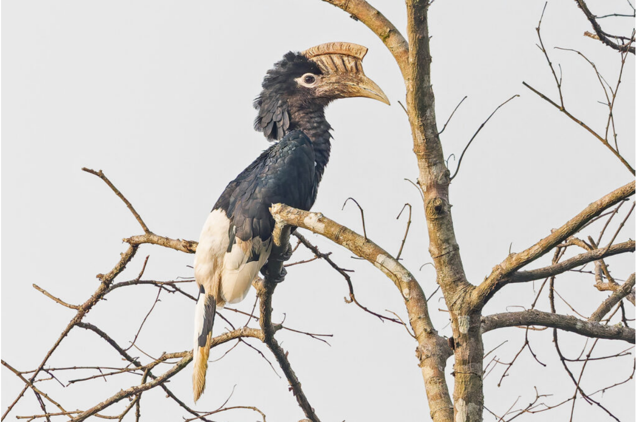
Brown-cheeked Hornbill