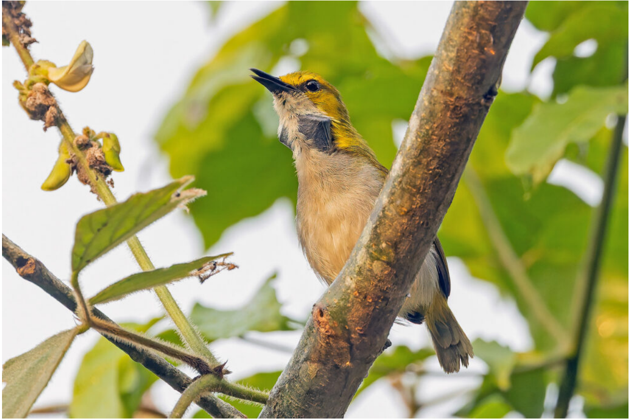
Yellow-browed Camaroptera