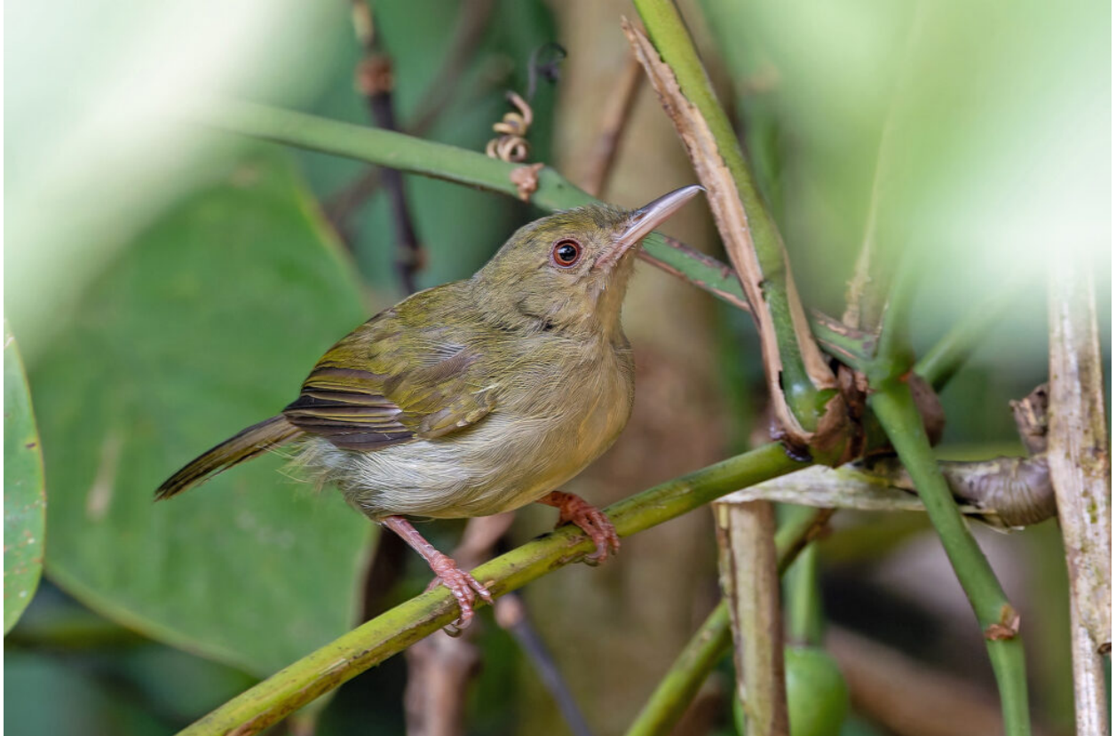
Grey Longbill