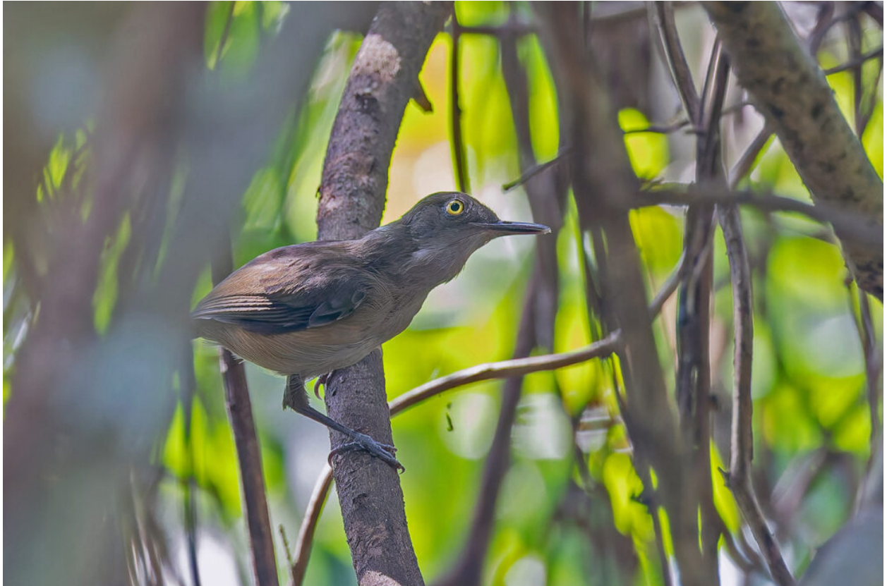
Kemp's Longbill