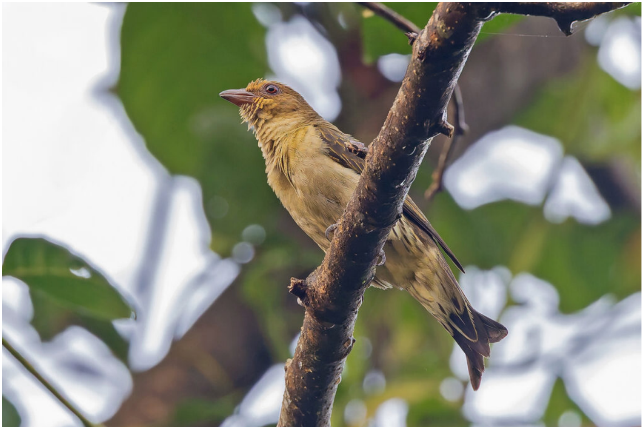
Lyre-tailed Honeyguide