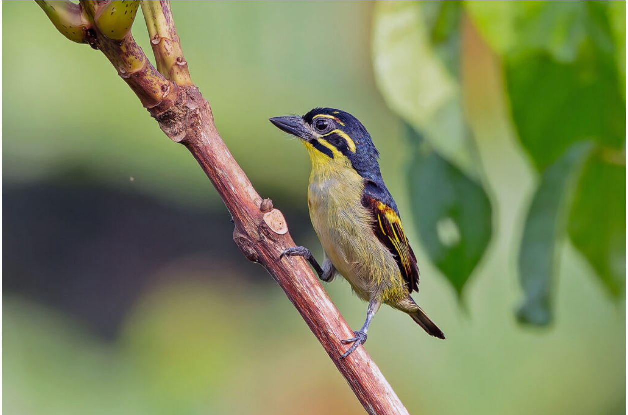
Red-rumped Tinkerbird