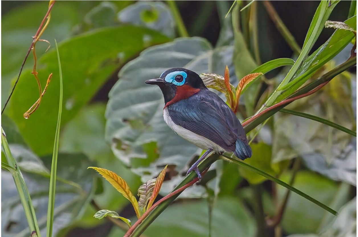
Red-cheeked Wattle-eye