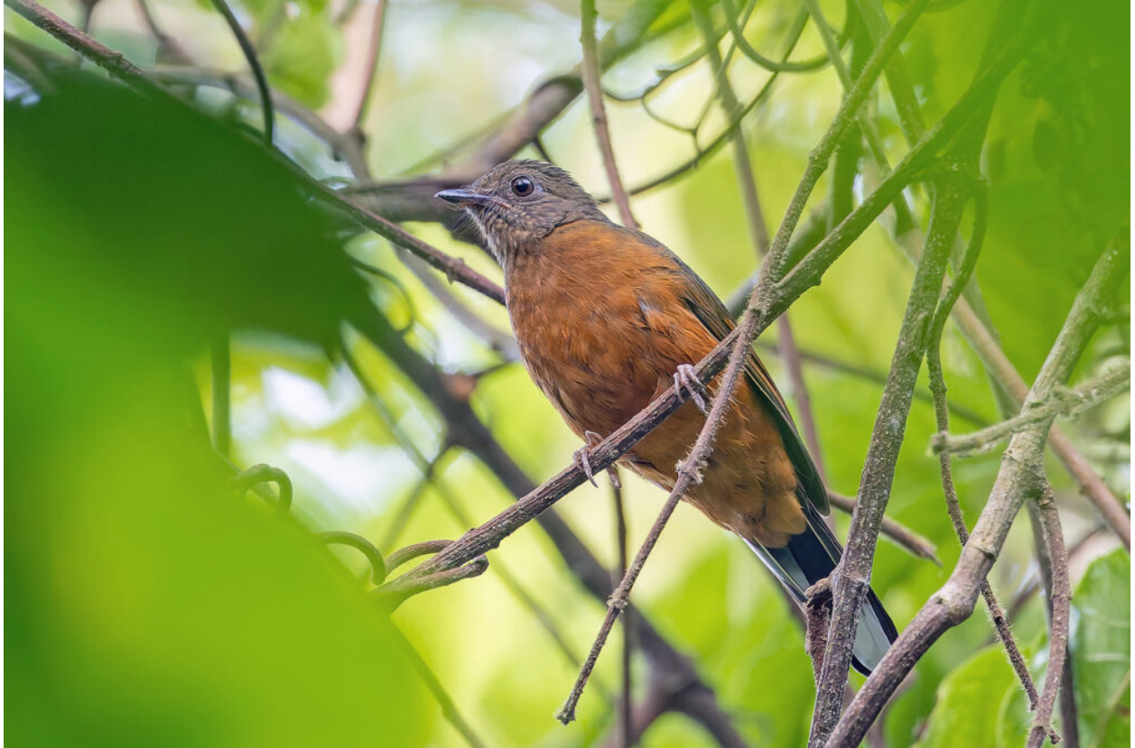
Finsch's Rufous Thrush