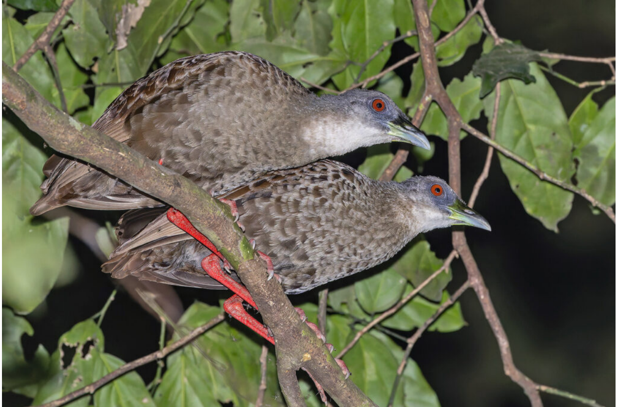
Nkulengu Rails