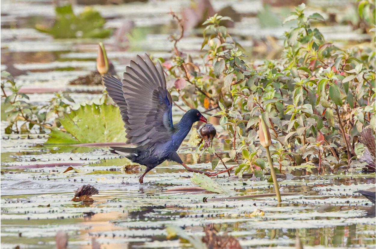
Allen's Gallinule