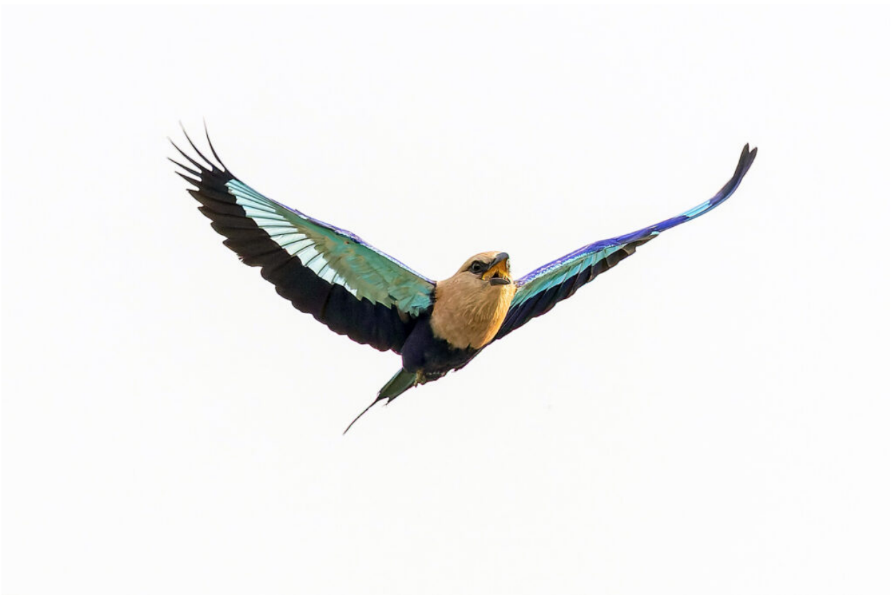
Blue-bellied Roller