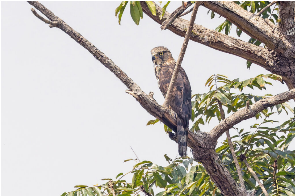
Congo Serpent Eagle