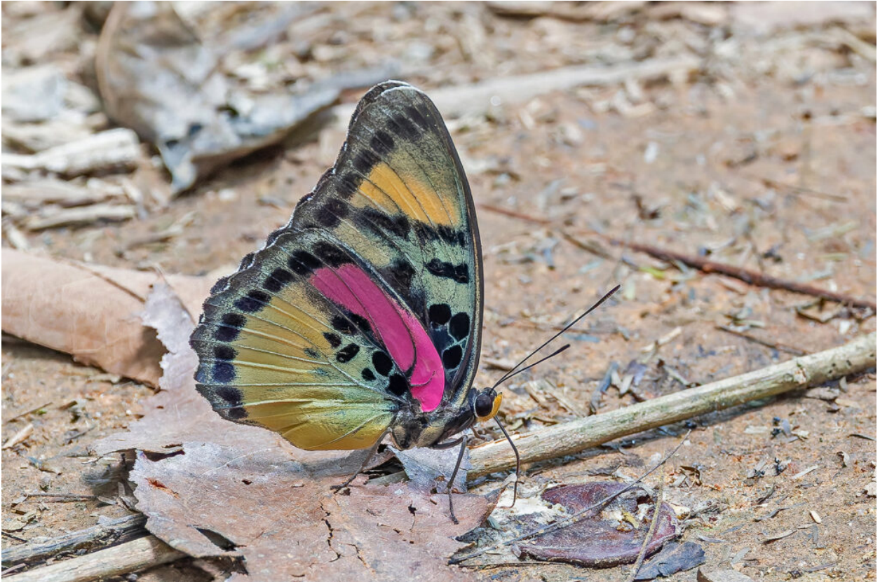
Crocker's Forester