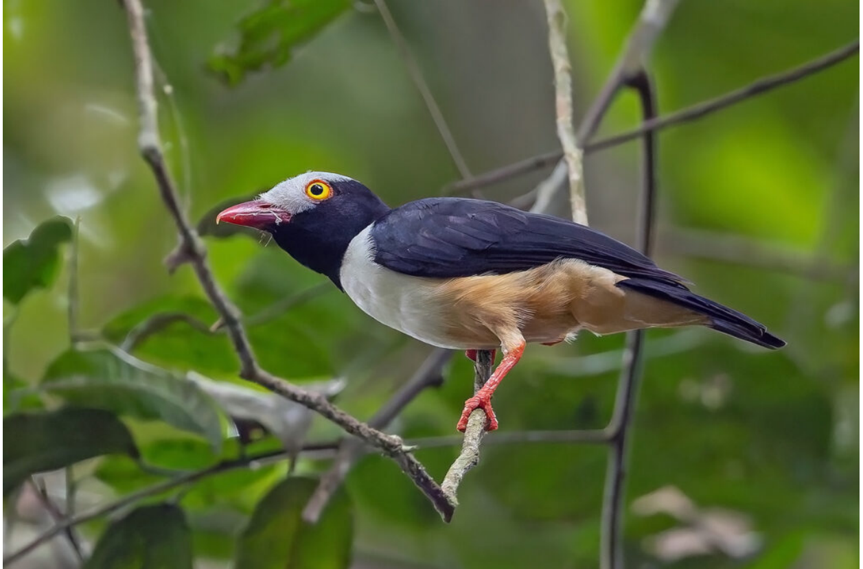
Red-billed Helmetshrike