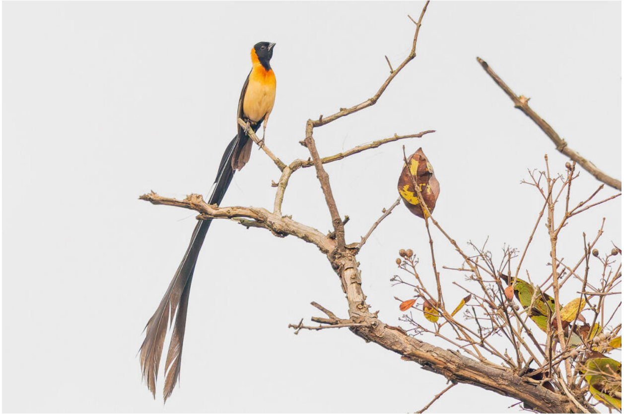
Togo Paradise Whydah