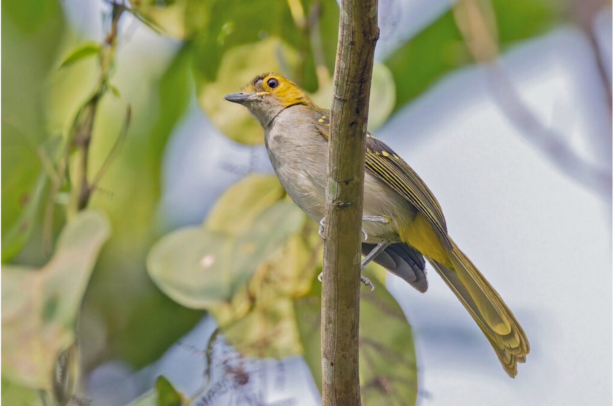
Western Nicator