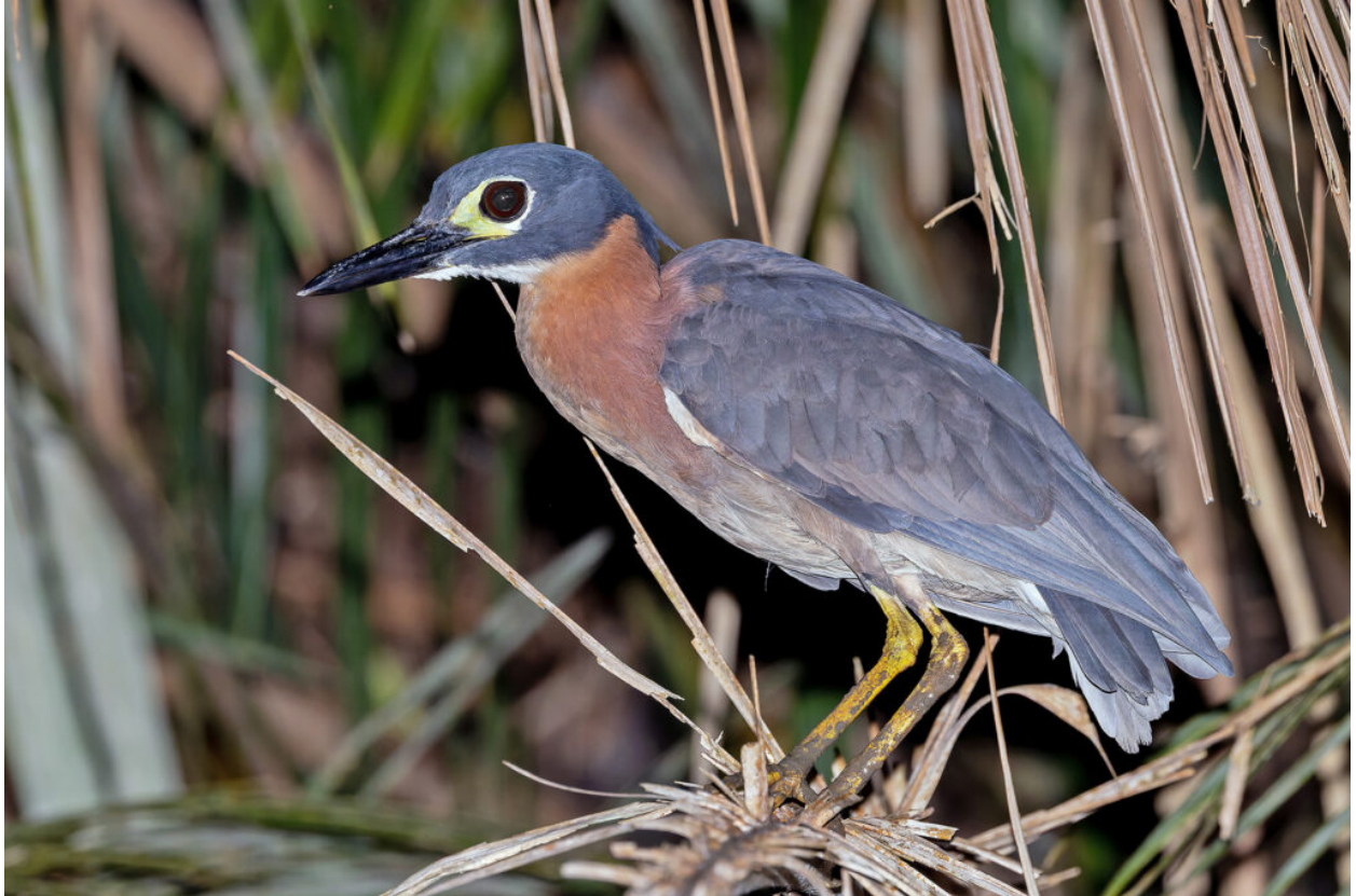
White-backed Night Heron