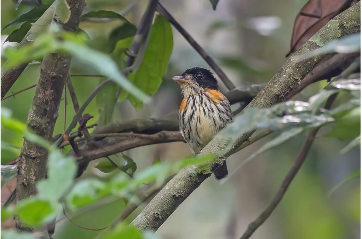
Rufous-sided Broadbill