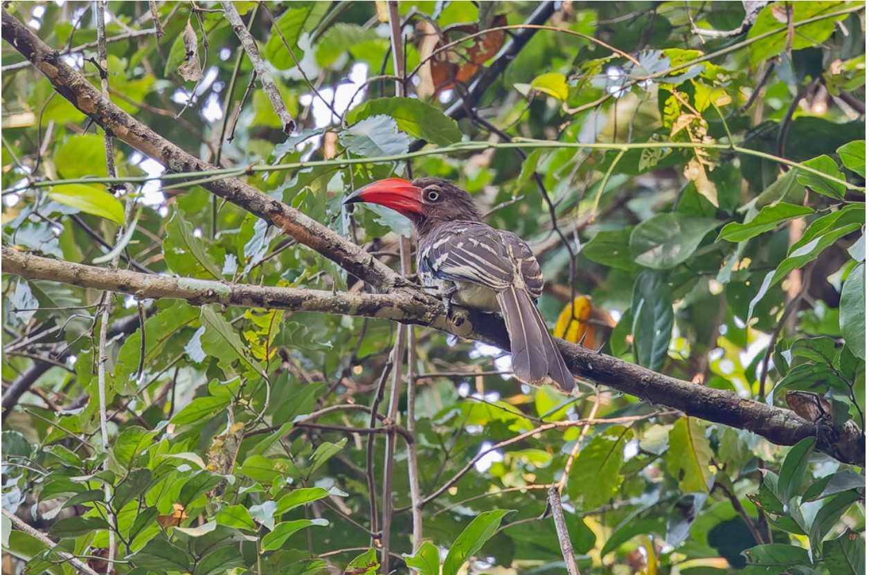
Red-billed Dwarf Hornbill