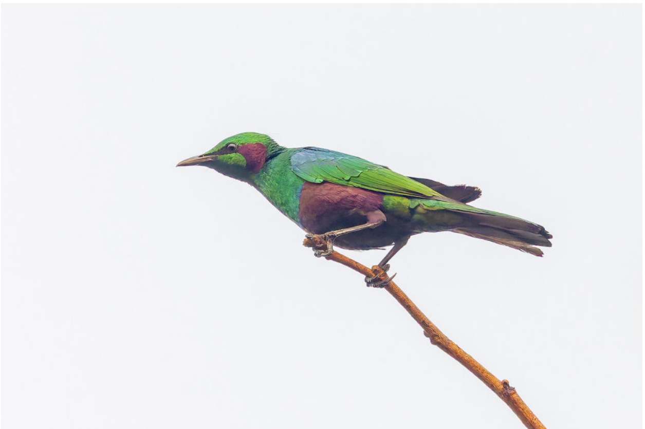
Emerald Starling