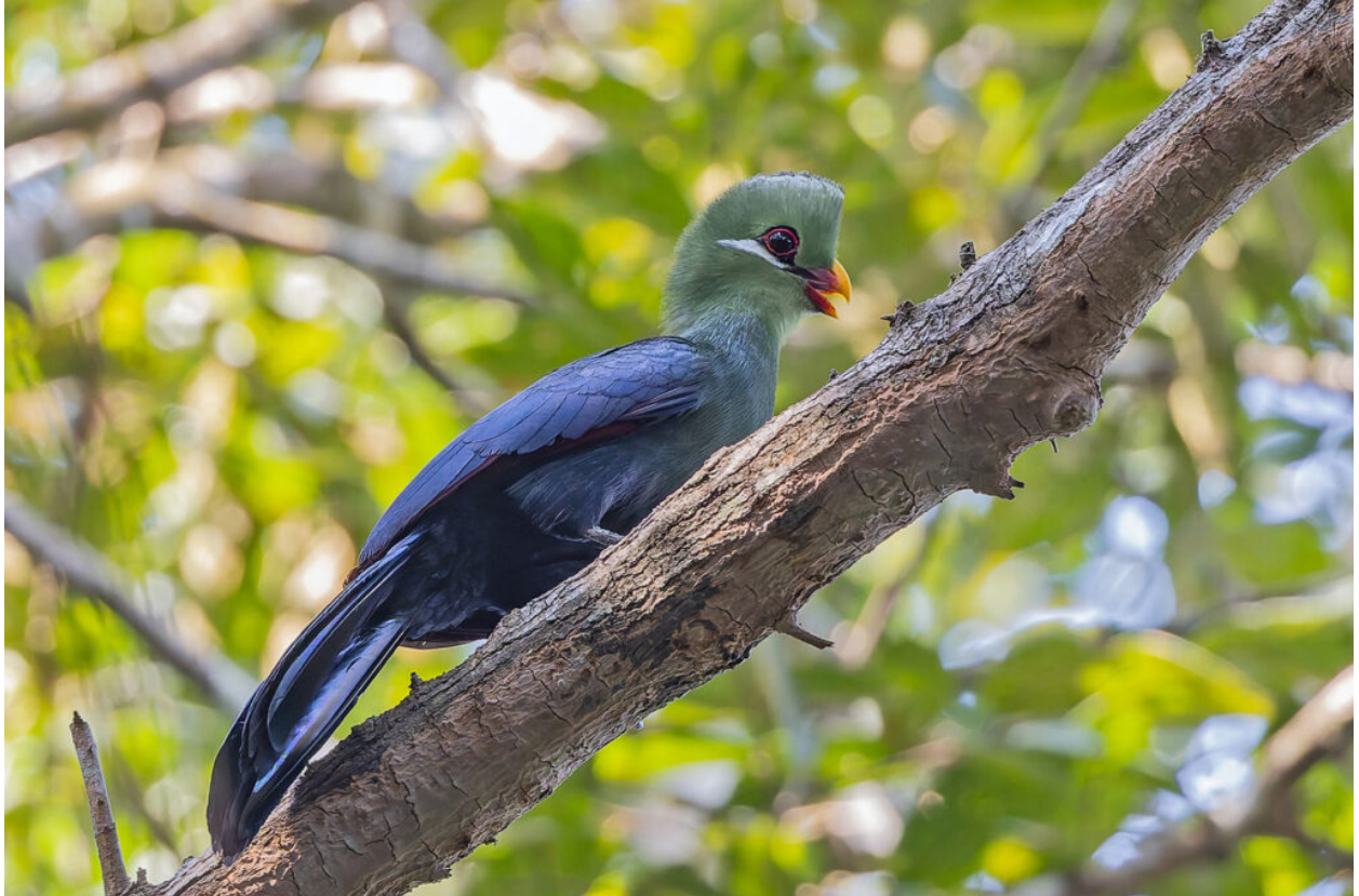
Yellow-billed Turaco