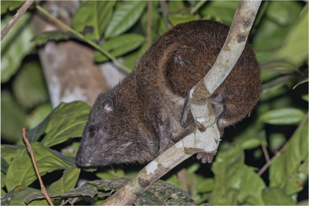
Western Tree Hyrax (image by Pete Morris)