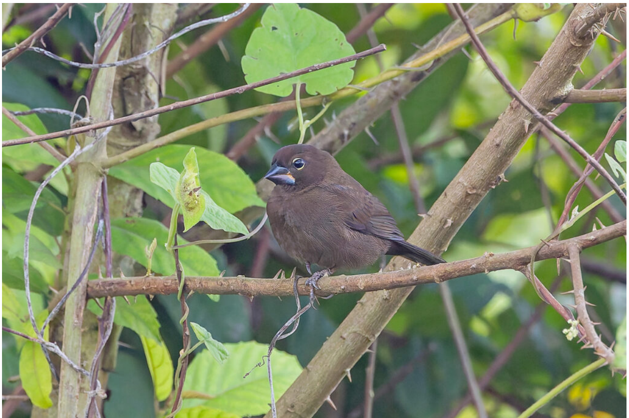
Crimson Seedcracker