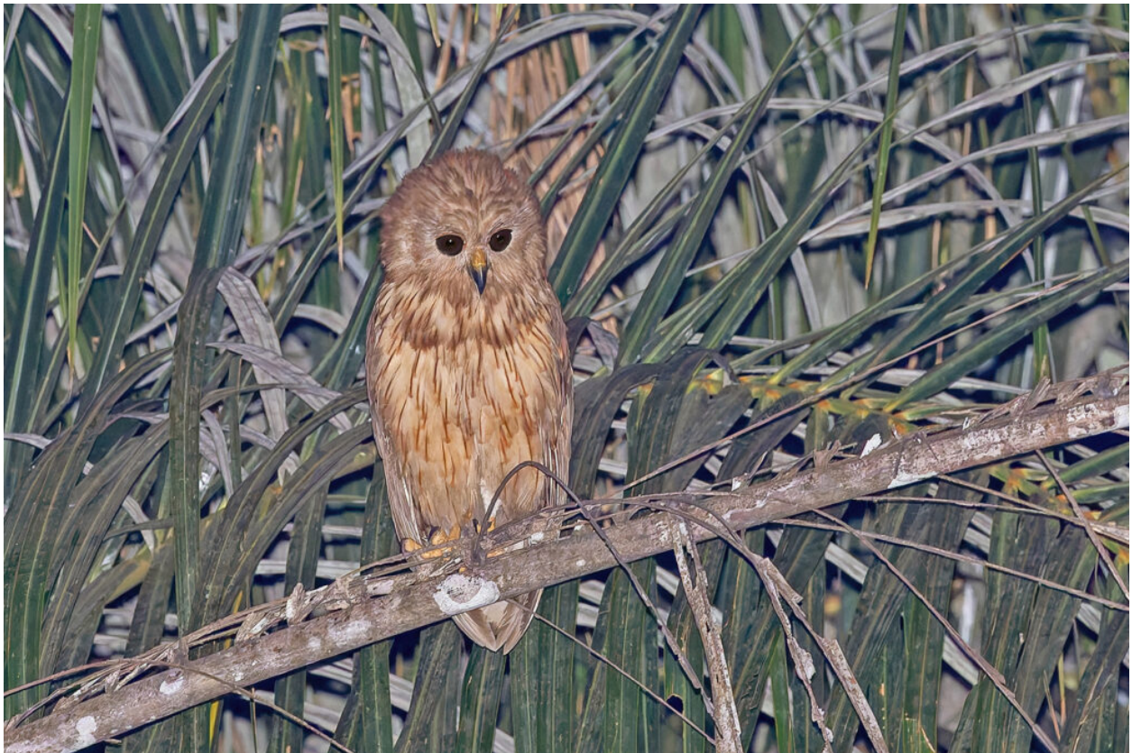
Rufous Fishing Owl

Striped Ground Squirrel Xerus erythropus A few seen, mostly running across roads!