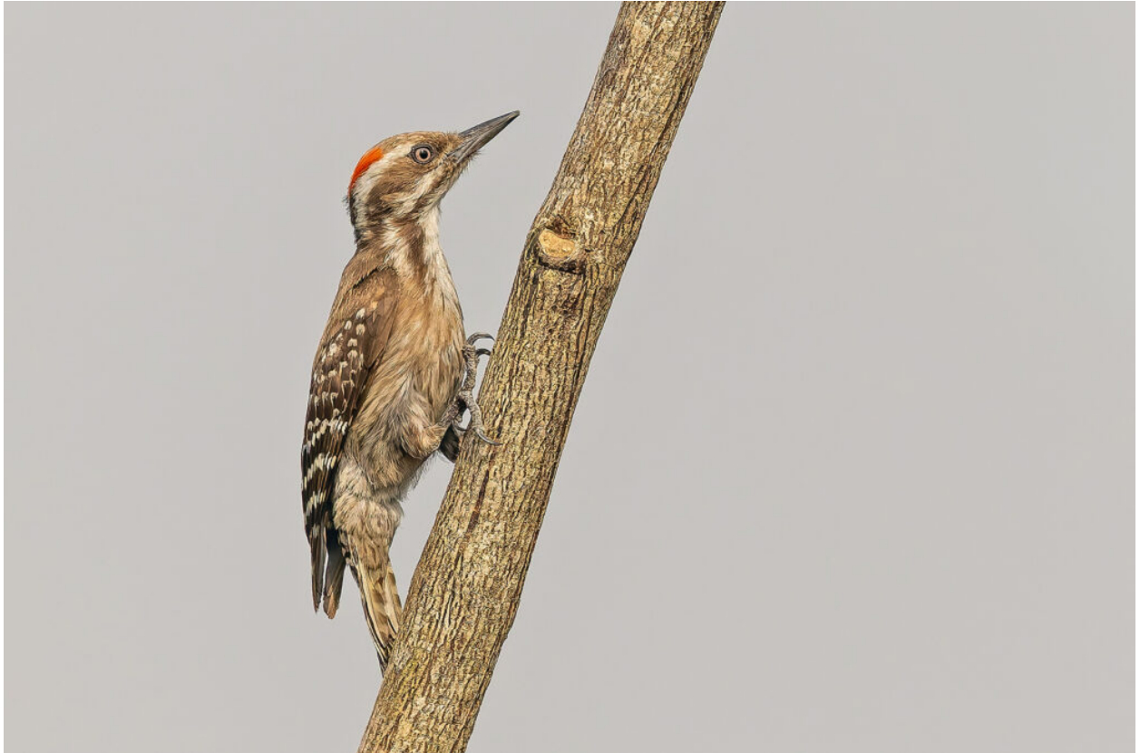
Brown-backed Woodpecker