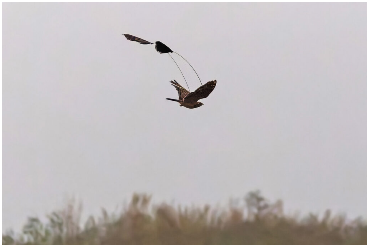
Standard-winged Nightjar