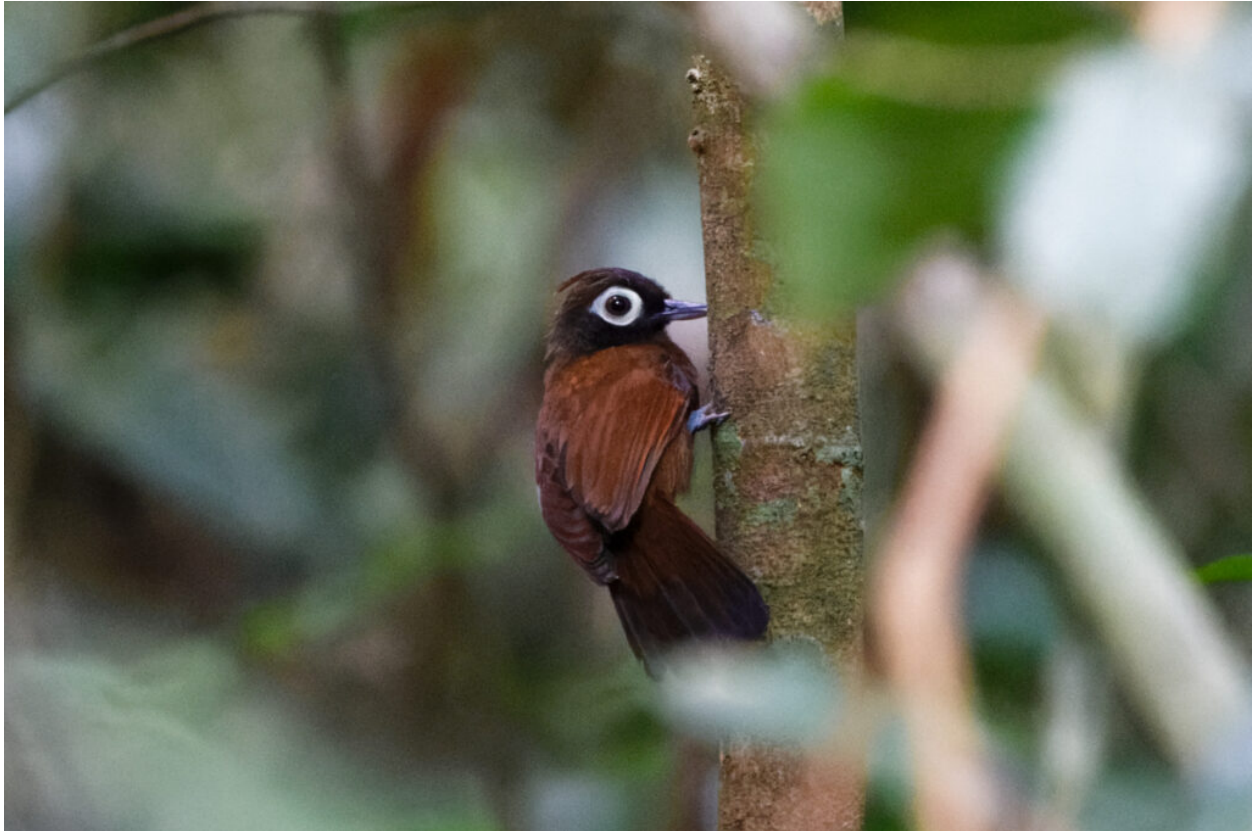
Bare-eyed Antbird