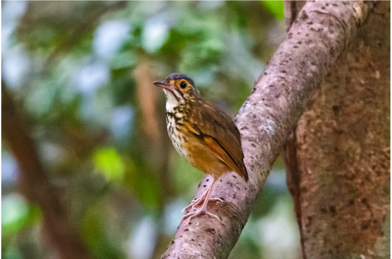
Alta Floresta Antpitta