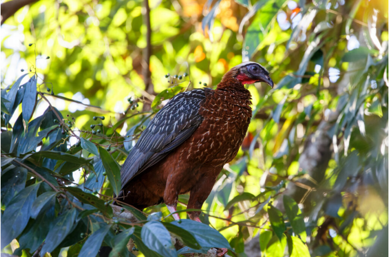
White-crested Guan