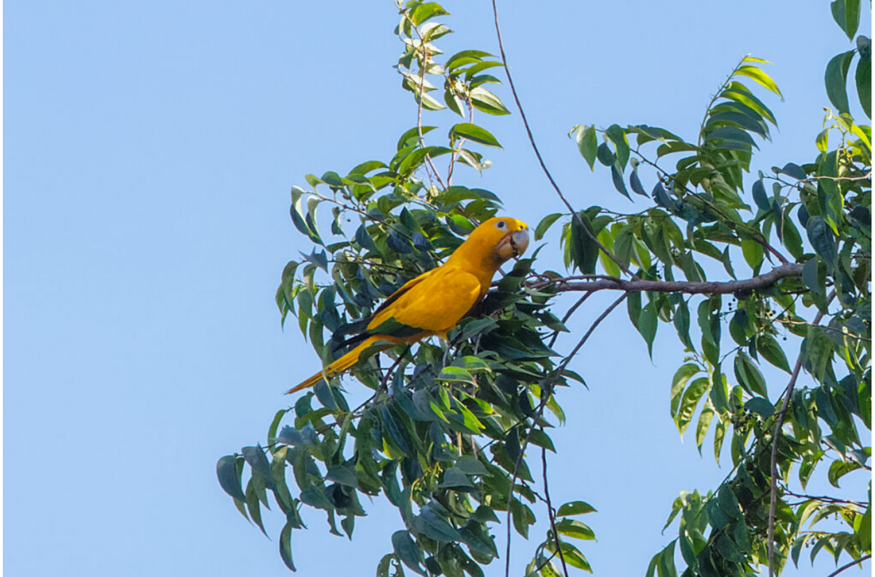
Golden Parakeet