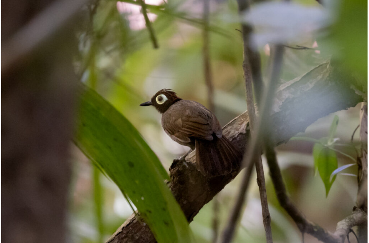
Harlequin Antbird