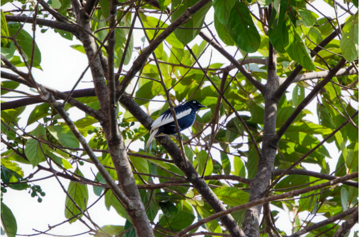
White-tailed Cotinga