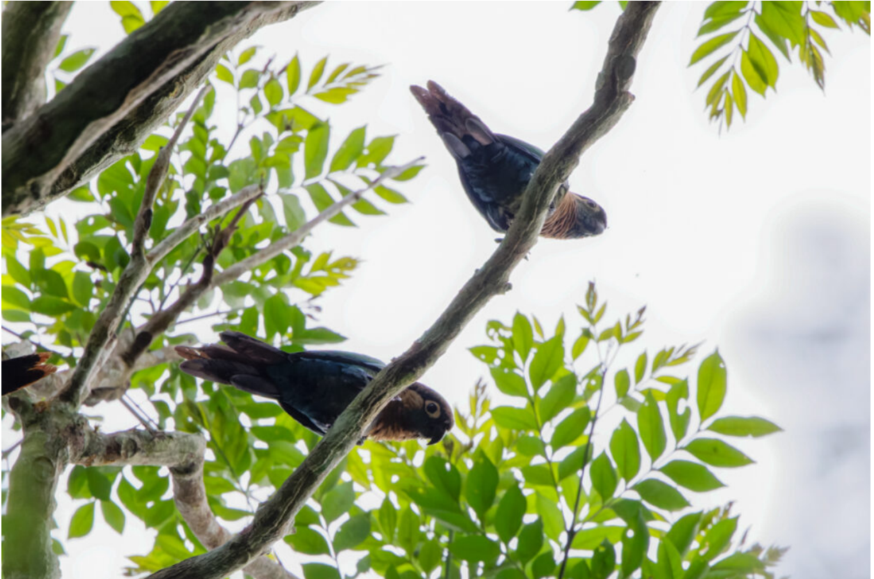
Pearly Parakeets