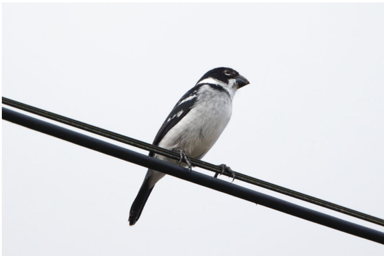
Wing-barred Seedeater (image by Leo Garrigues)