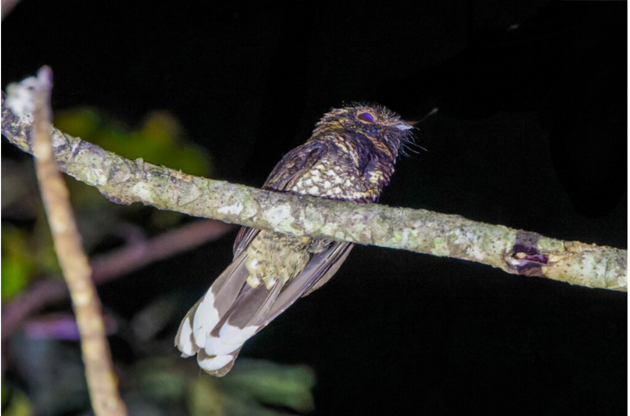
Silky-tailed Nightjar