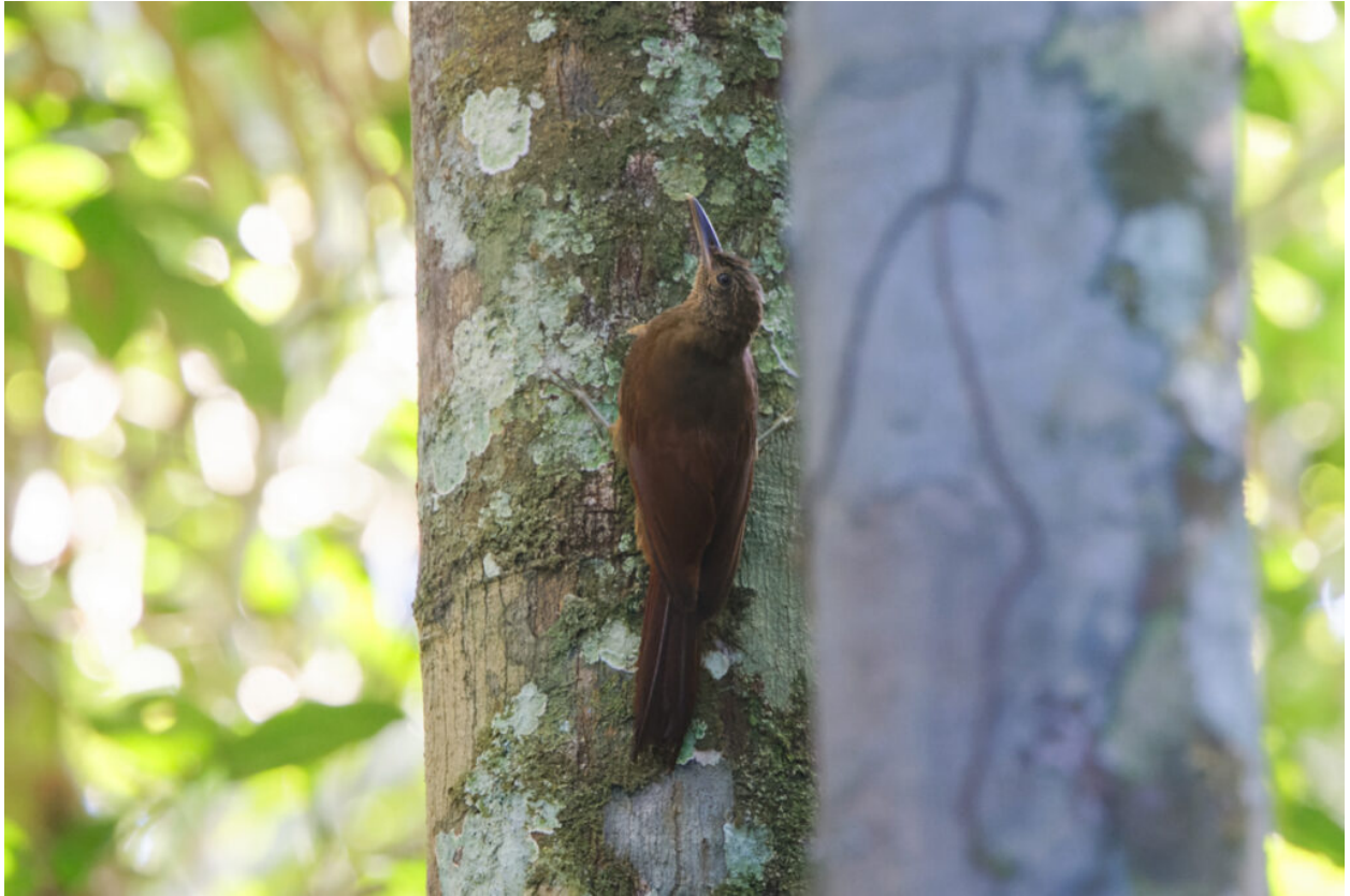
Hoffman's Woodcreeper