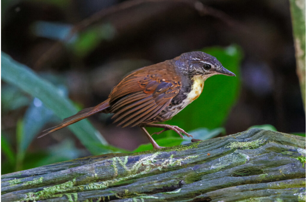
Rusty-belted Tapaculo