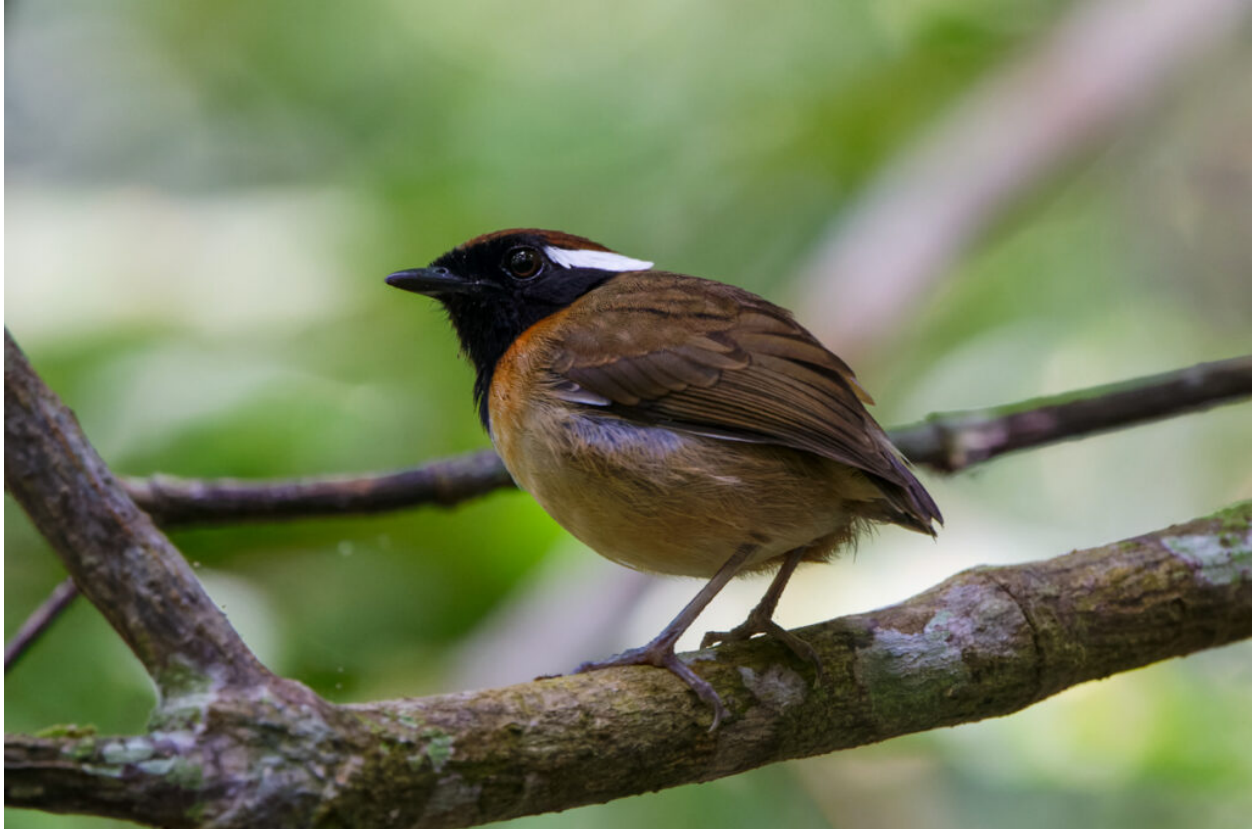
Black-breasted Gnatcatcher