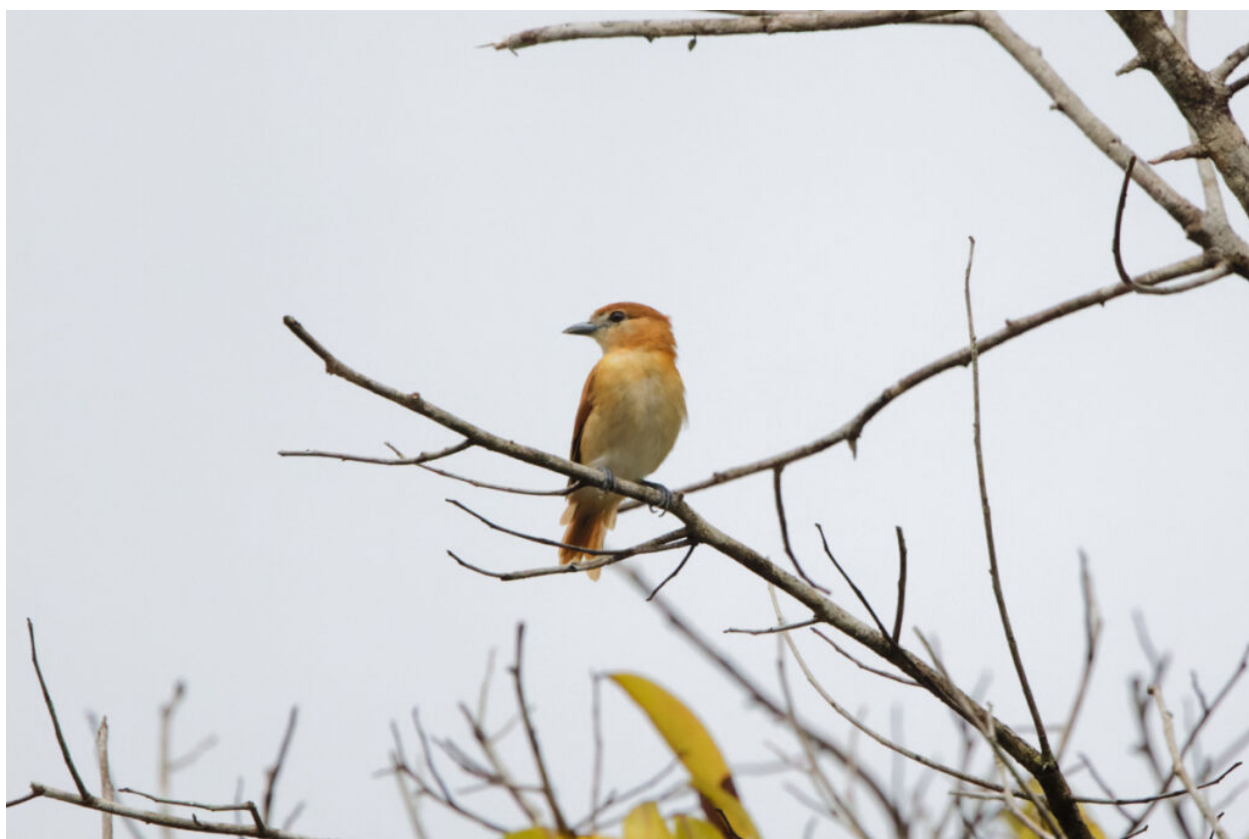
Cinereous Becard