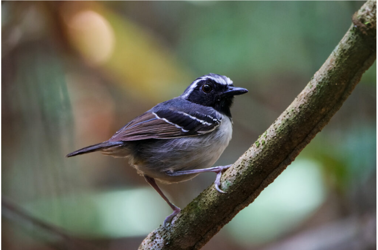
Black-faced Antbird