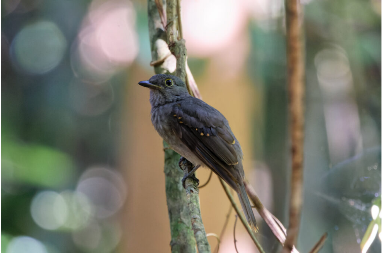
Cinereous Mourner