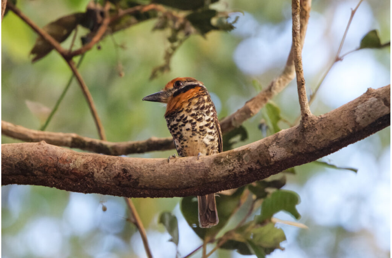
Spotted Puffbird