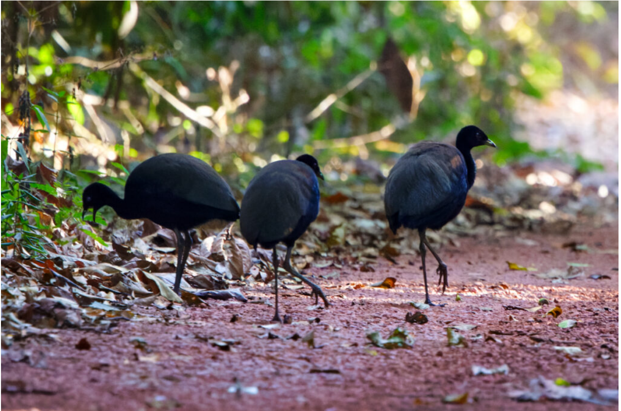
Dark-winged Trumpeters (Xingu)