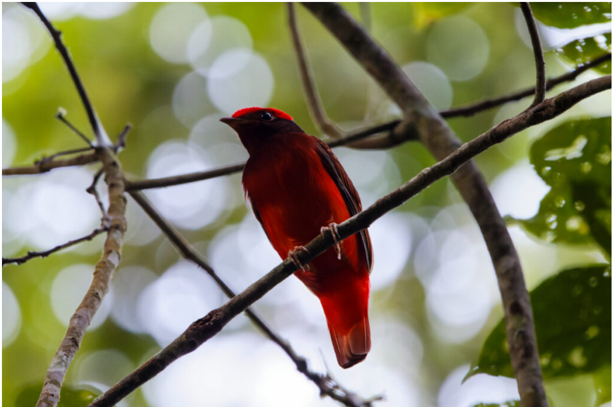
Guianan Red-Cotinga