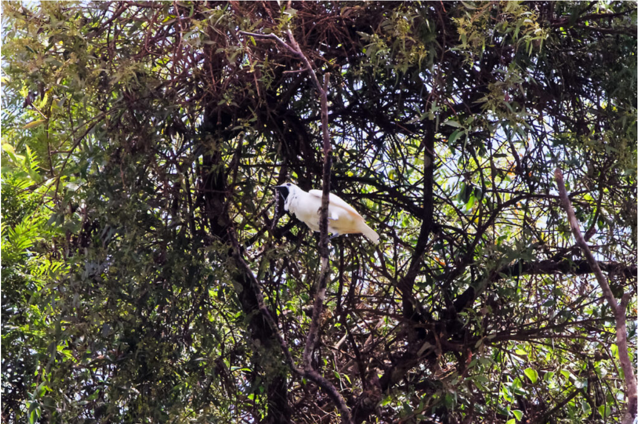
White Bellbird