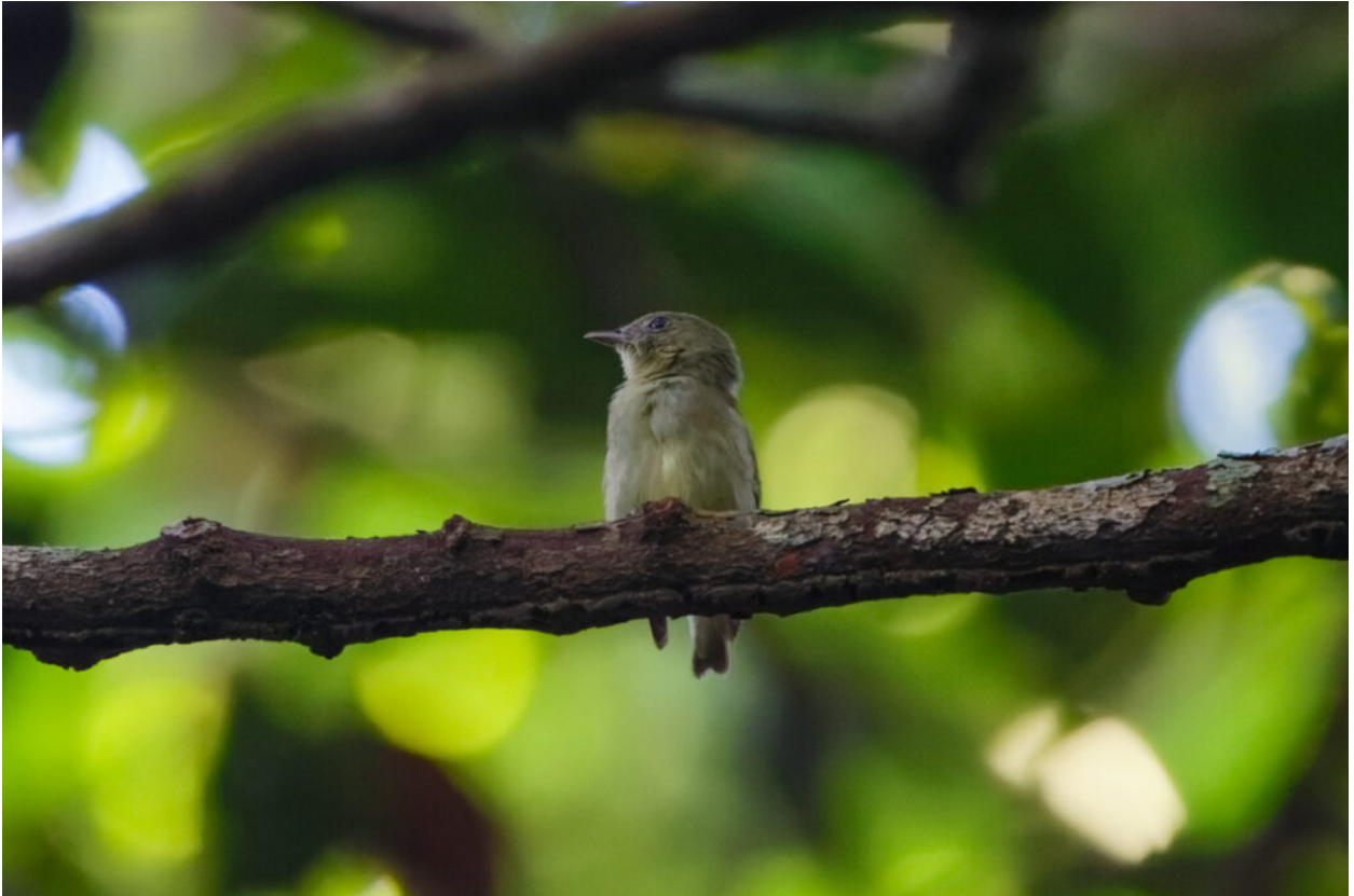
Dwarf Tyrant Manakin