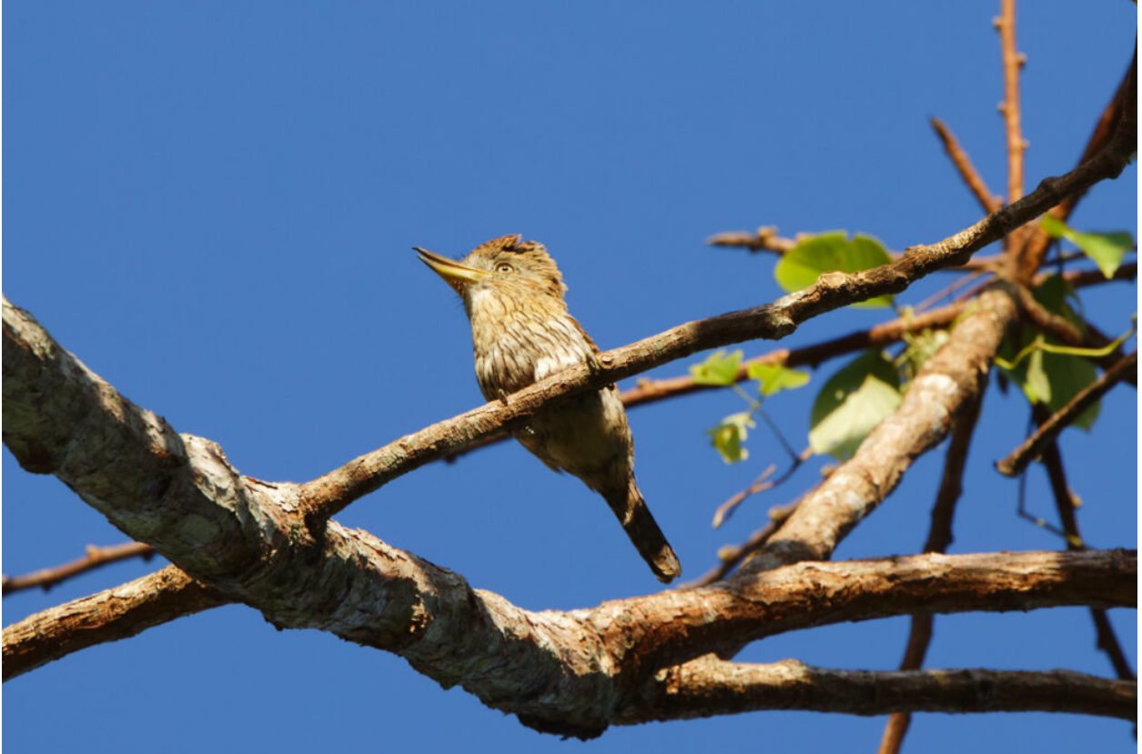
Eastern Striolated Puffbird (image by Leo Garrigues)