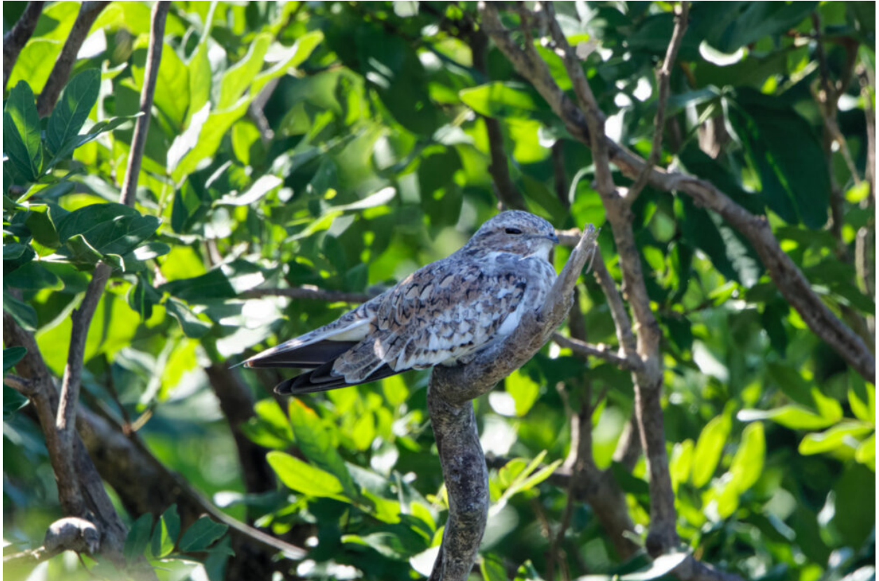
Sand-colored Nighthawk