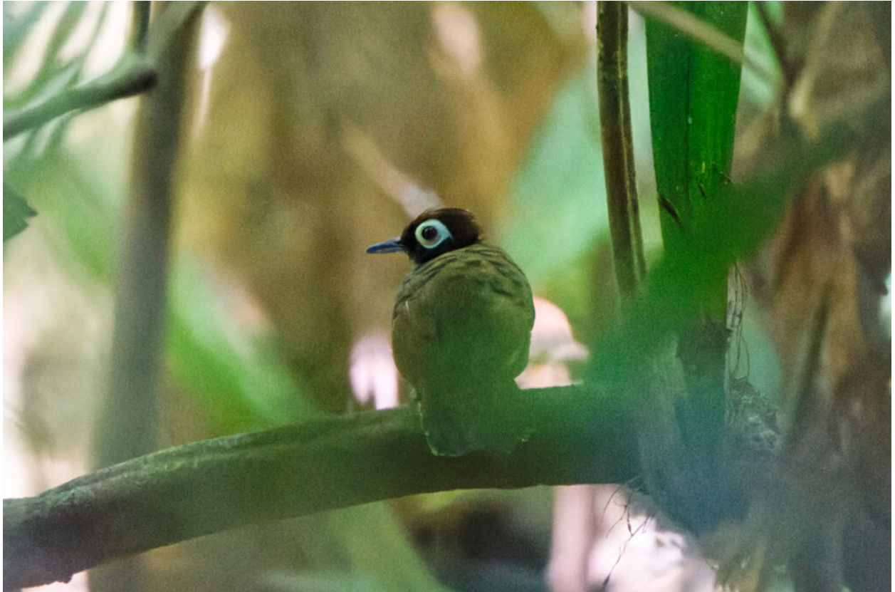
Harlequin Antbird