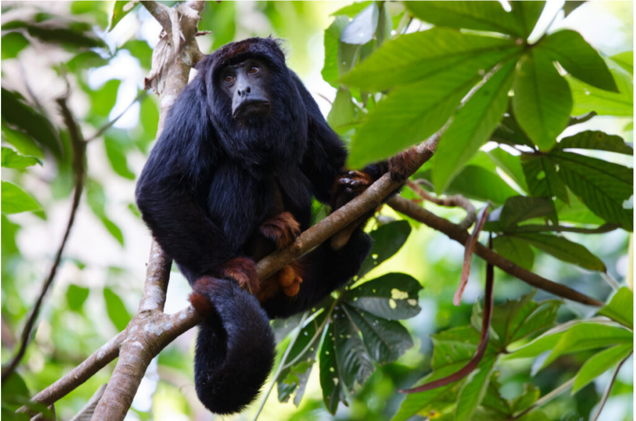
Eastern Red-handed Howler