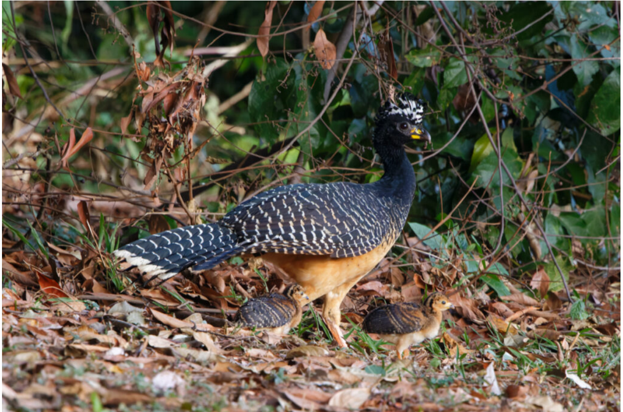
Bare-faced Curassows