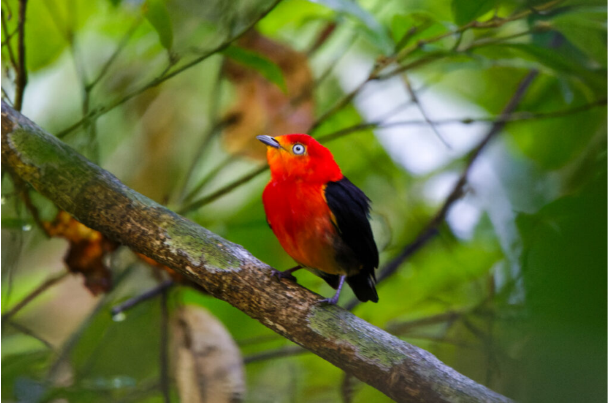
Crimson-hooded Manakin