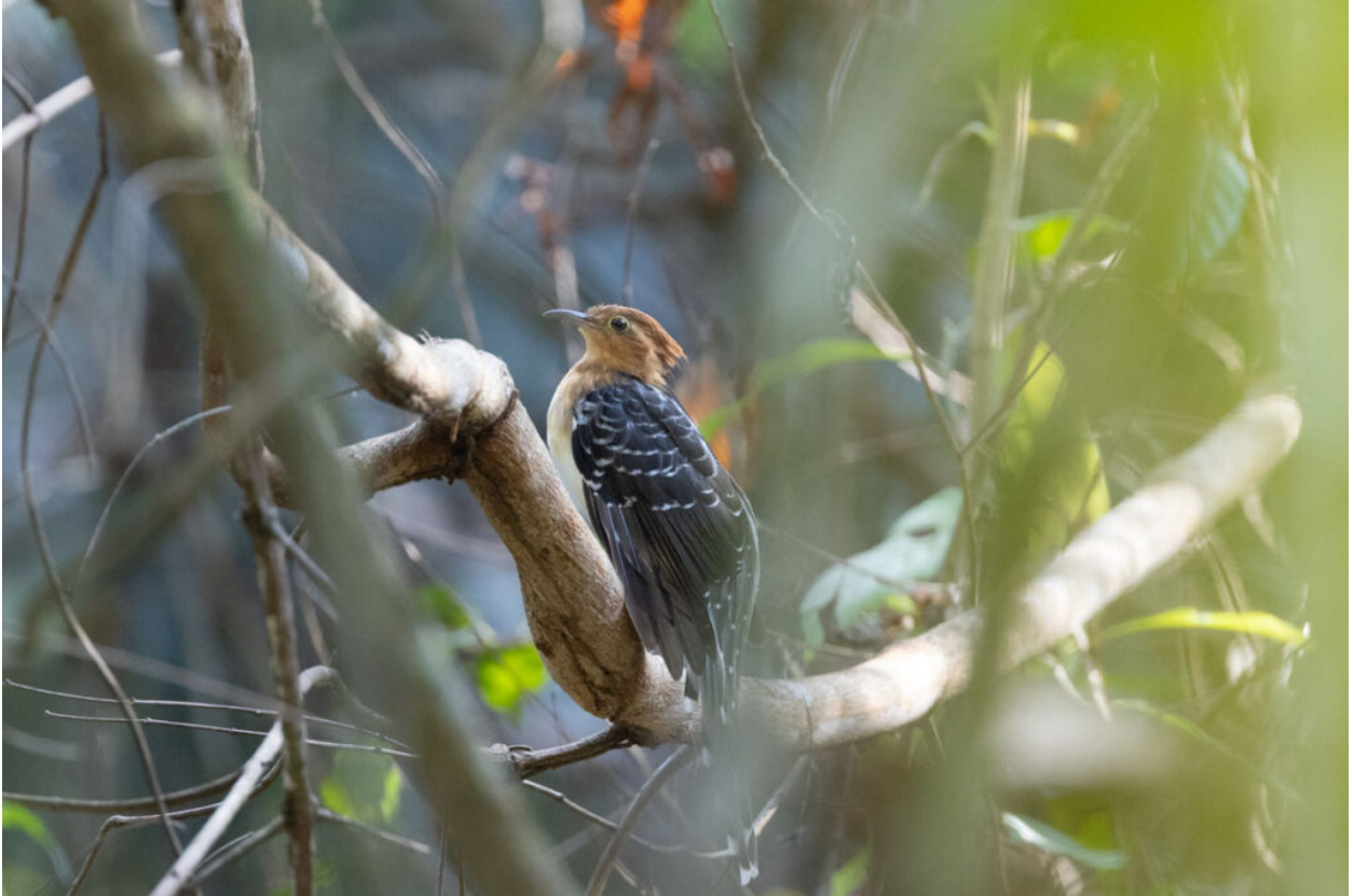
Pavonine Cuckoo