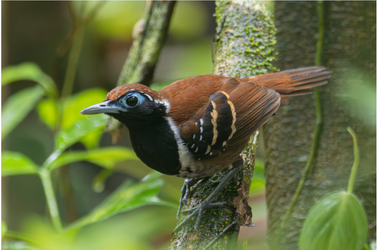
Ferruginous-backed Antbird