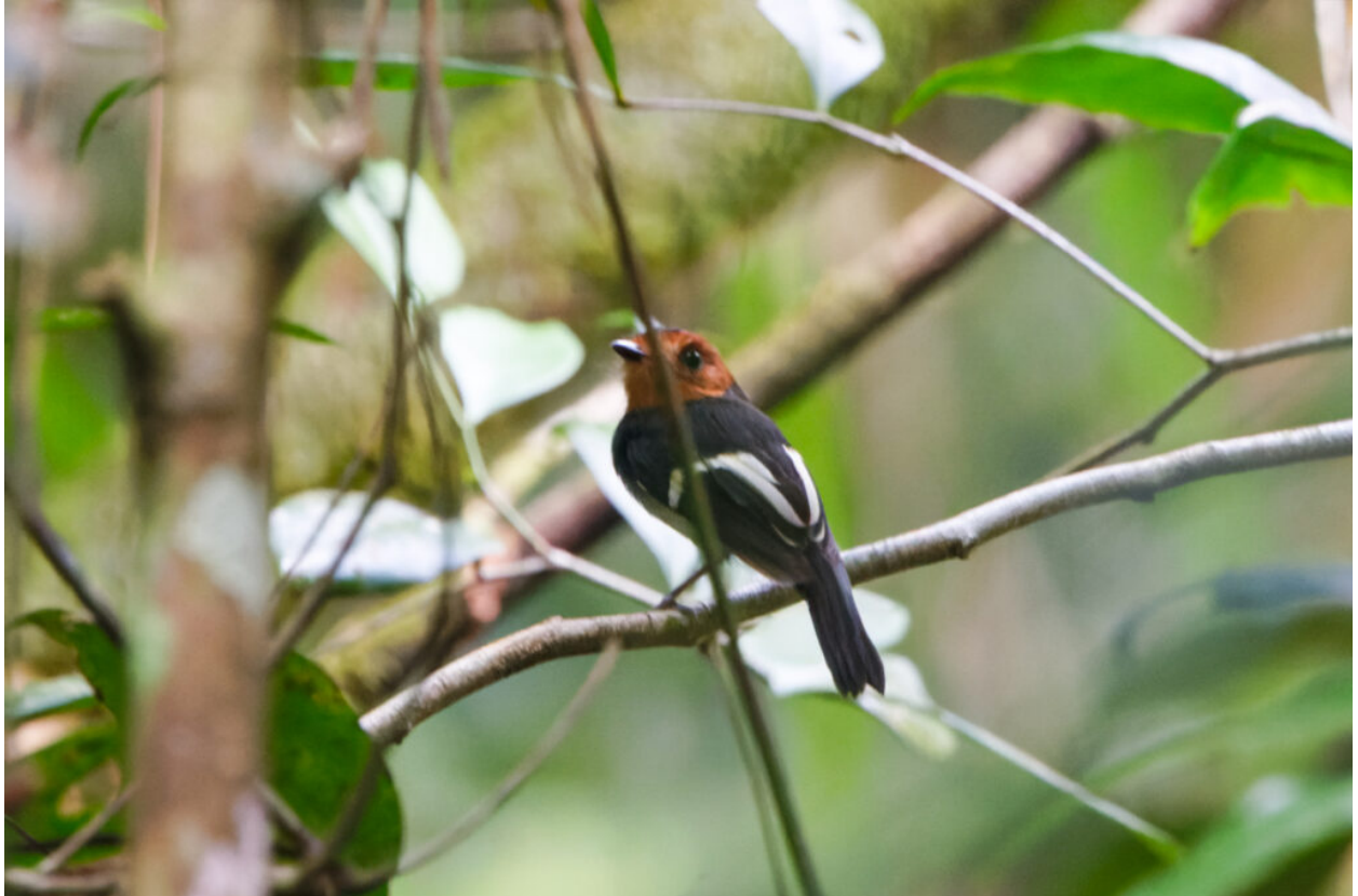
Black-chested Tyrant