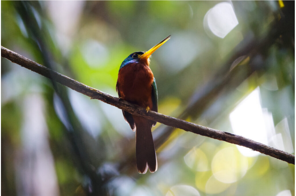
Blue-necked Jacamar