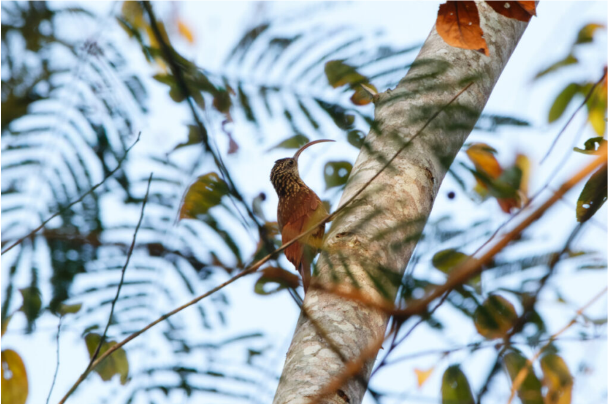
Xingu Scythebill