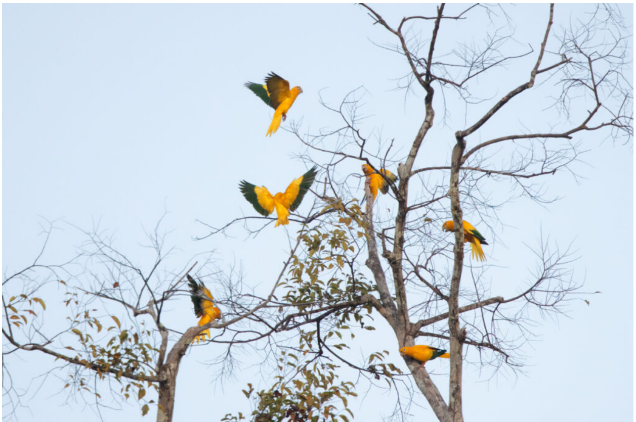
Golden Parakeets