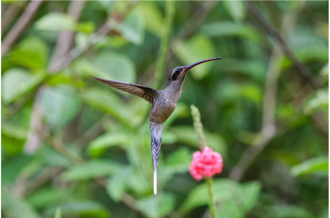
Long-tailed Hermit