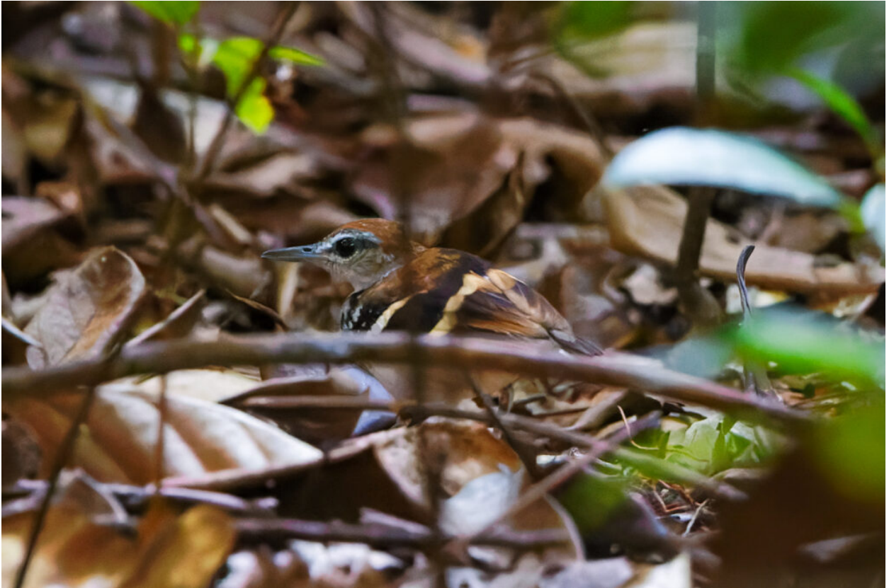
Banded Antbird