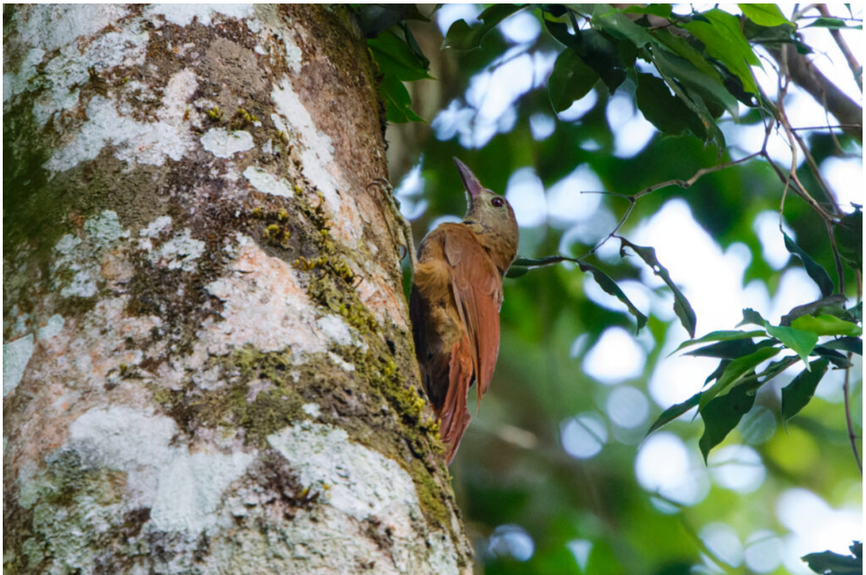
Uniform Woodcreeper (Brigida's)