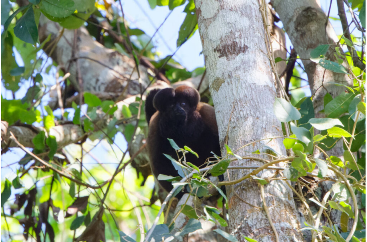
Uta Hick's Bearded Saki (image by Leo Garrigues)