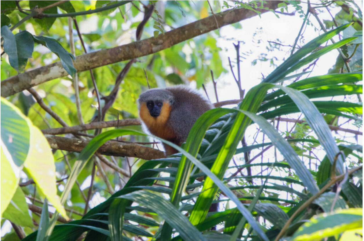
Red-bellied Titi