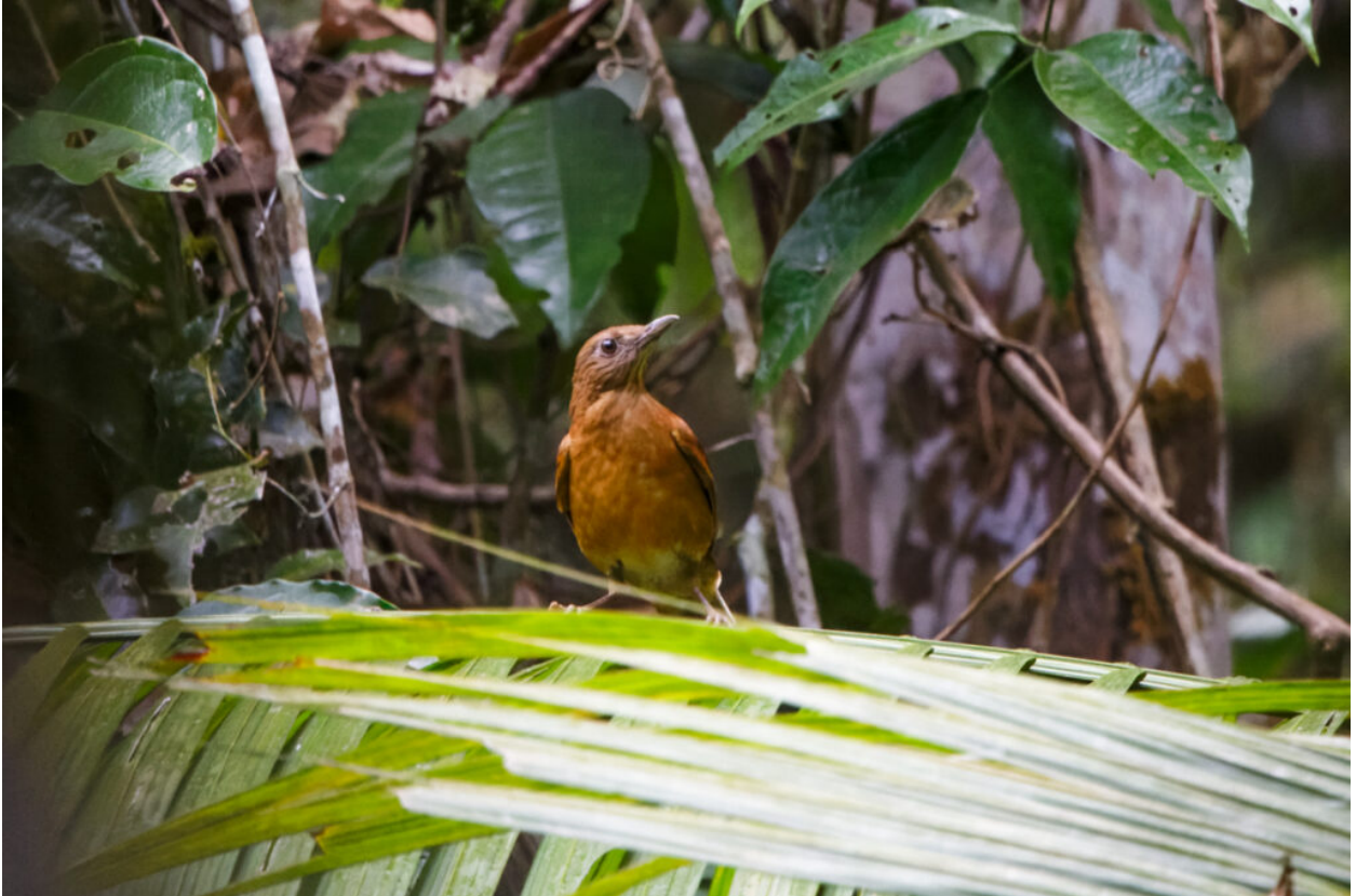
Cocoa Thrush