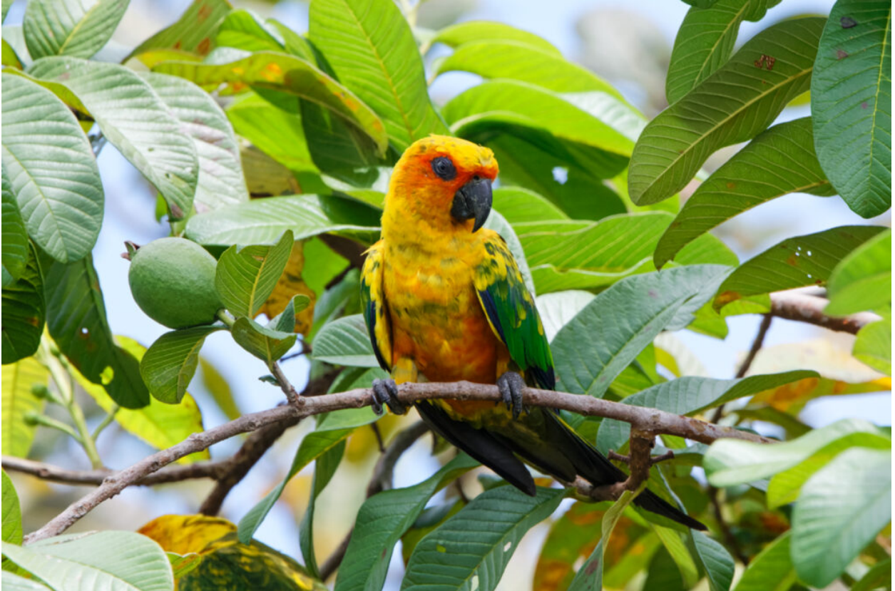
Sulphur-breasted Parakeet