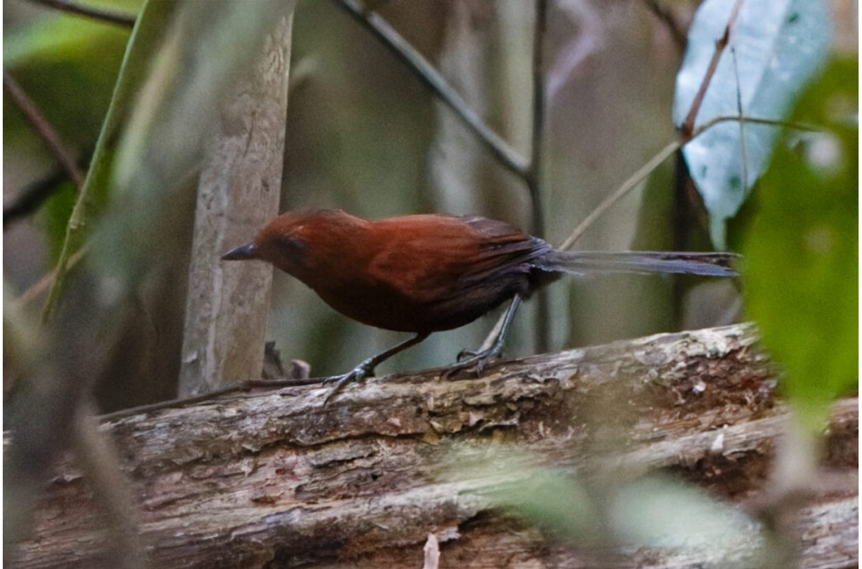
Ruddy Spinetail