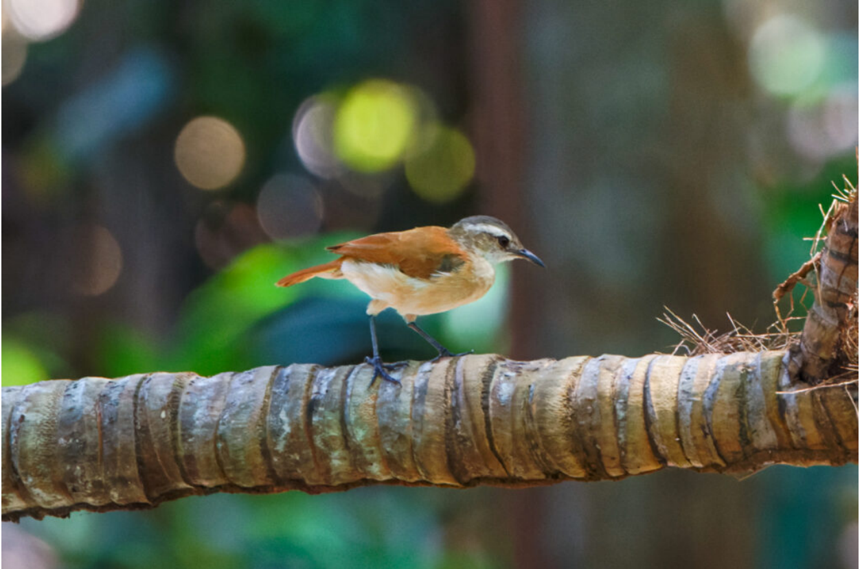
Lesser Hornero