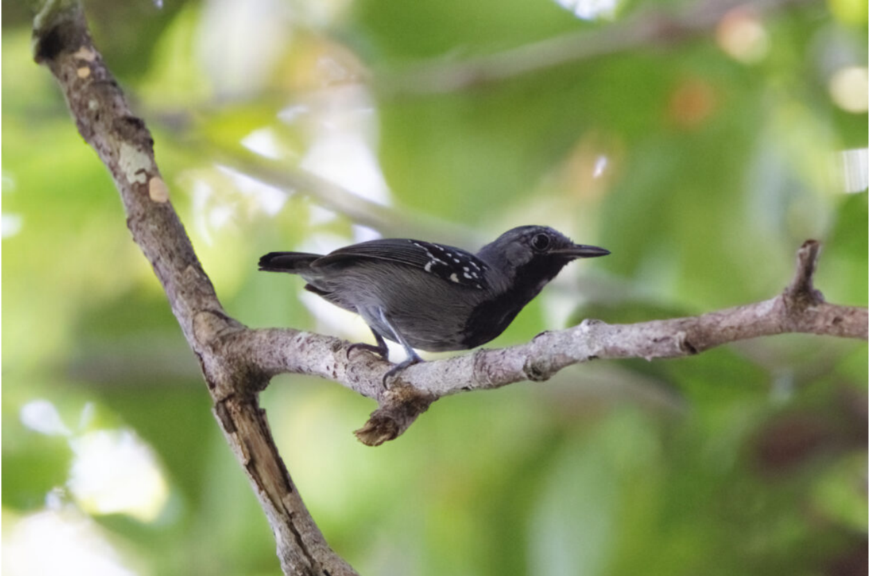
Ihering's Antwren