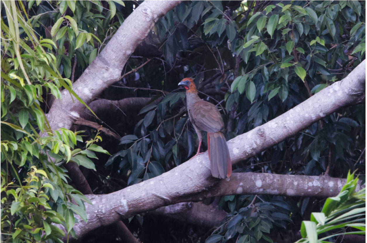
Little Chachalaca