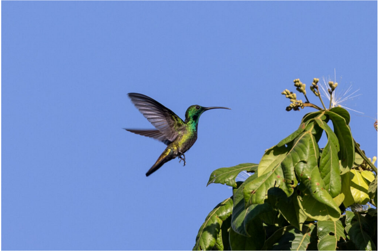
Green-throated Mango