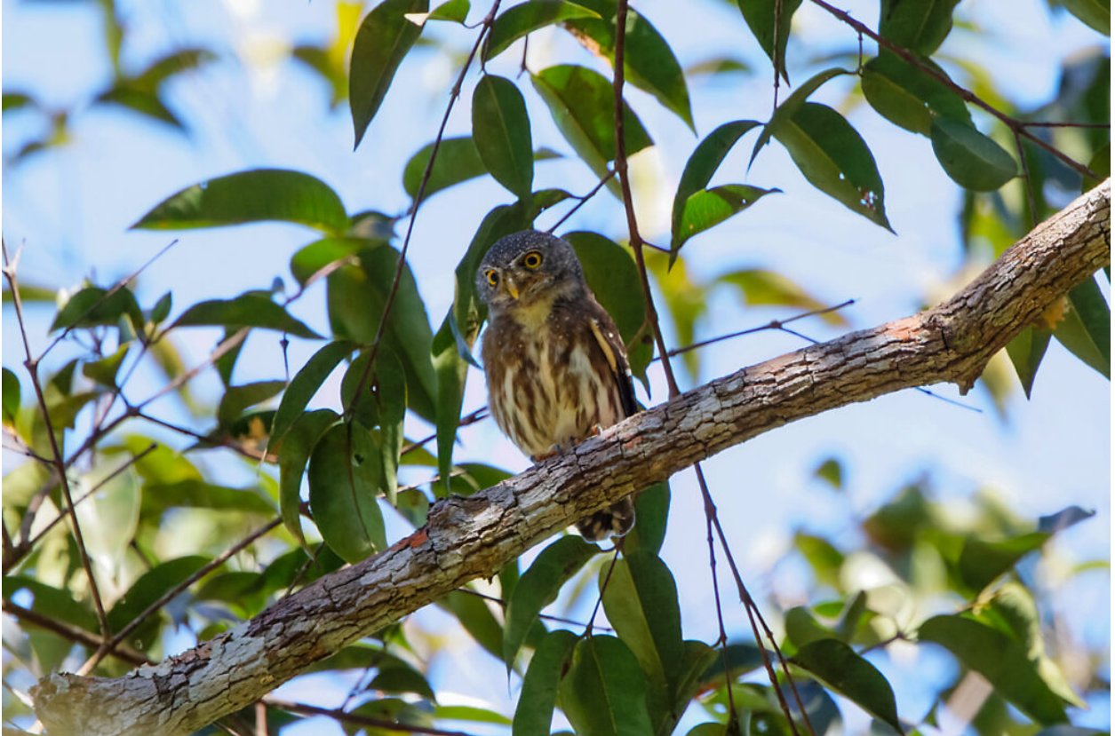
Amazonian Pygmy Owl