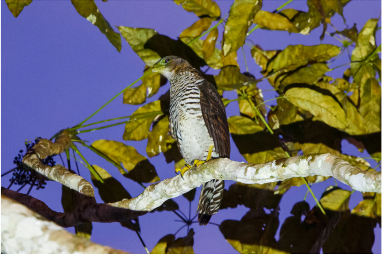
Slaty-backed Forest Falcon