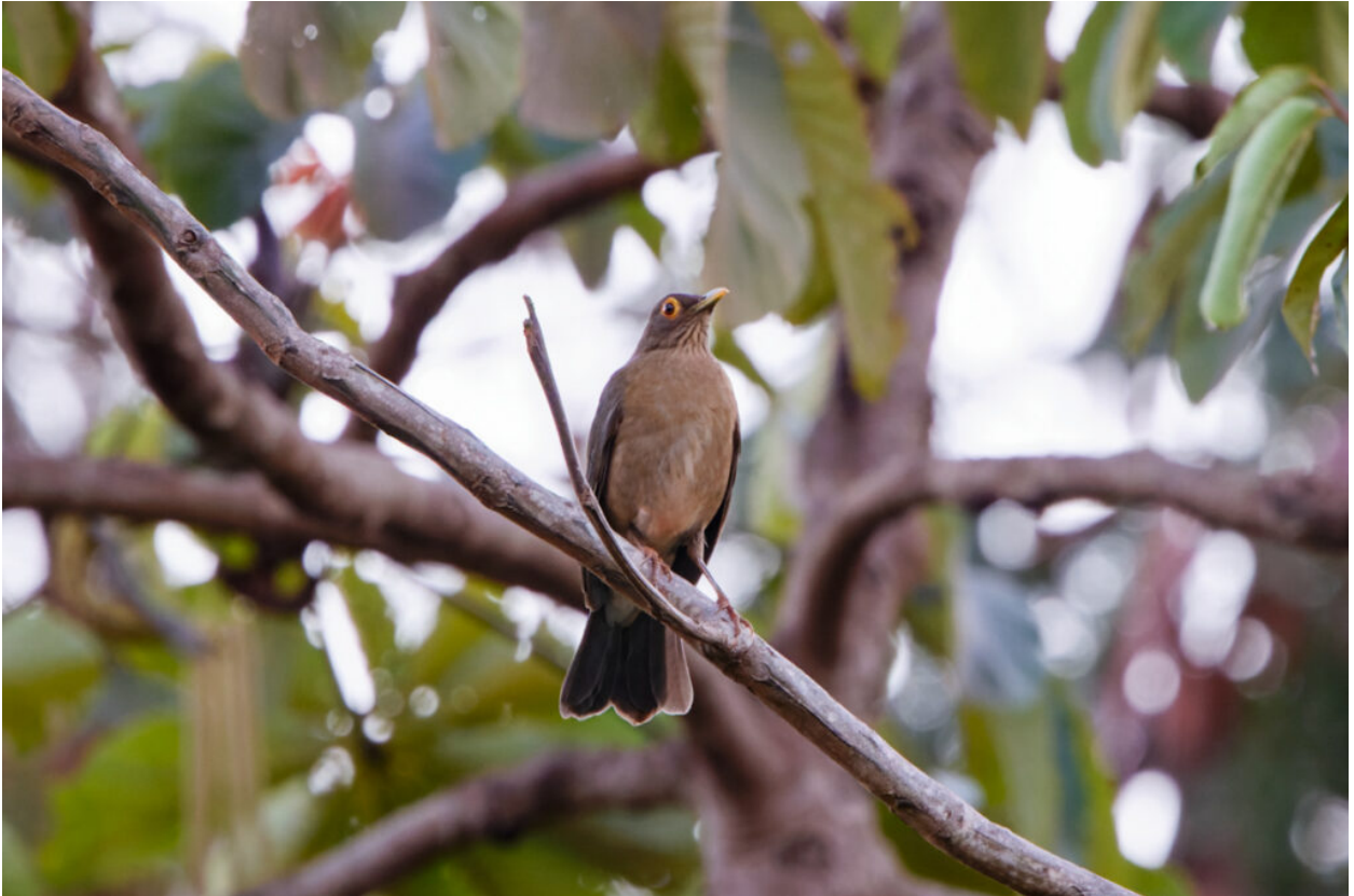
Spectacled Thrush