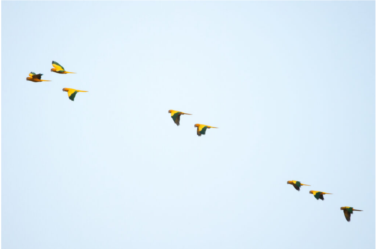
Golden Parakeets