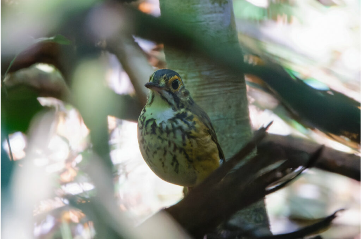
Snethlage's Antpitta