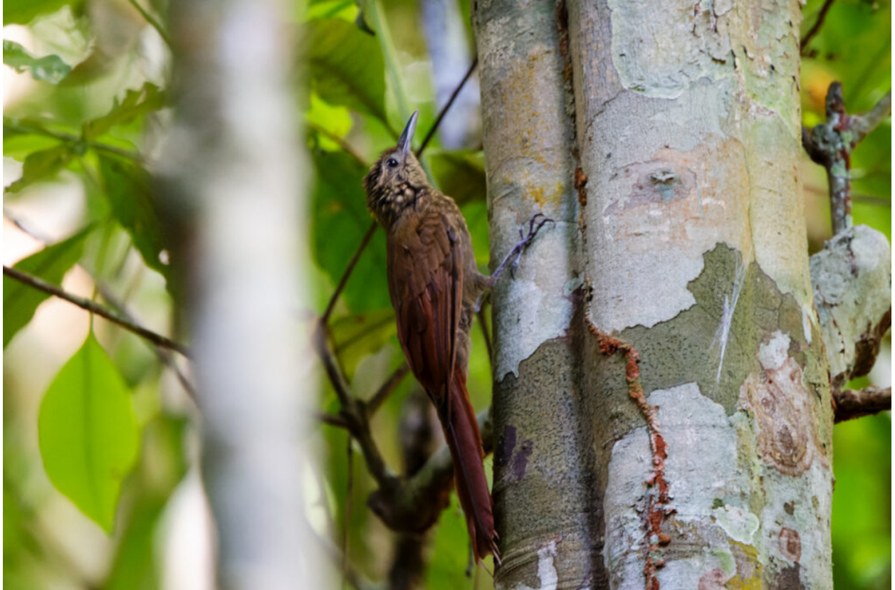
Mournful Long-tailed Woodcreeper