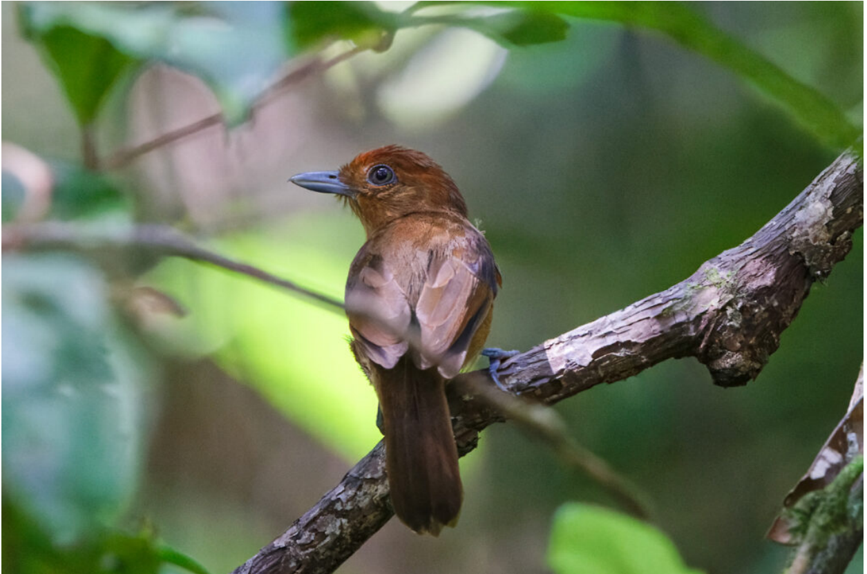
White-shouldered Antshrike