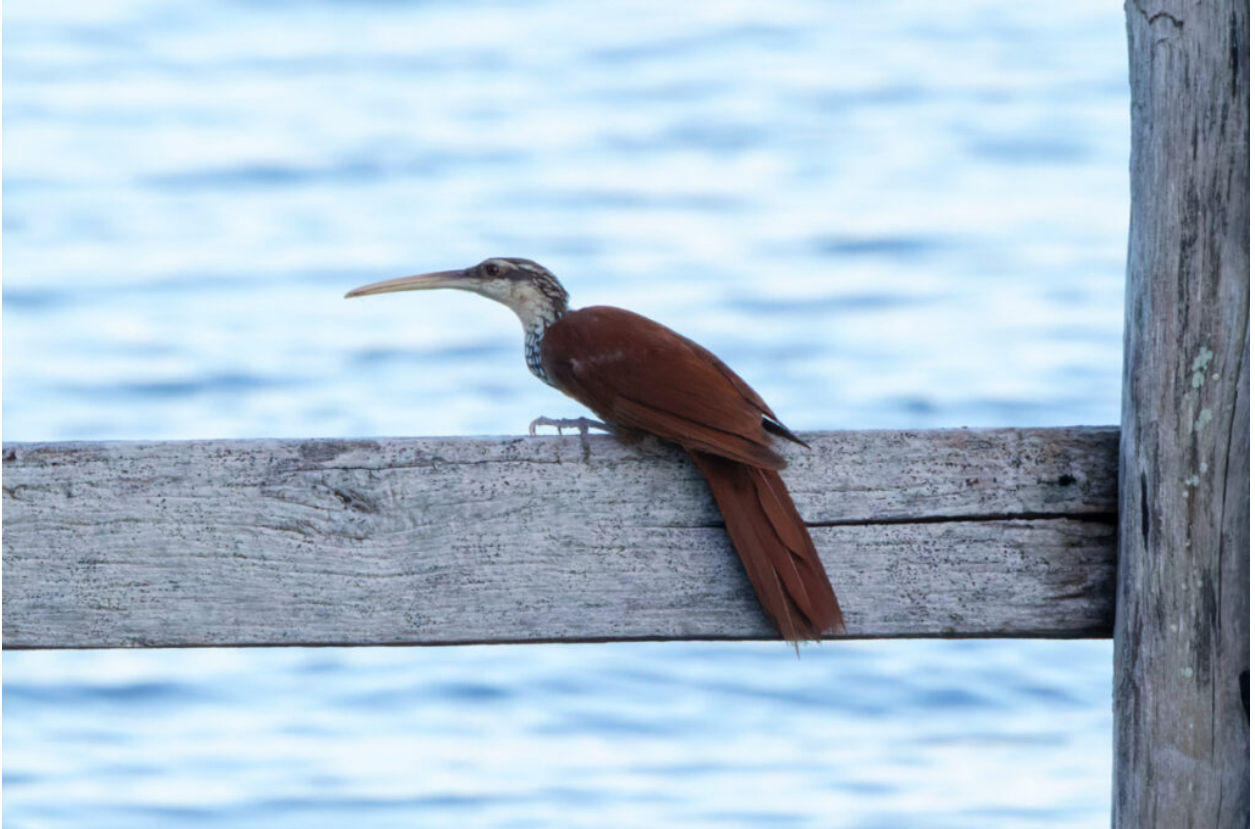
Long-billed Woodcreeper