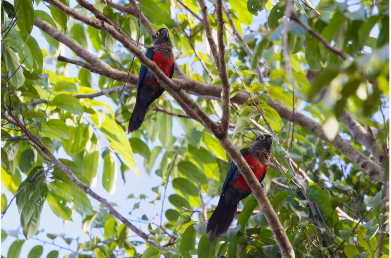
Crimson-bellied Parakeets