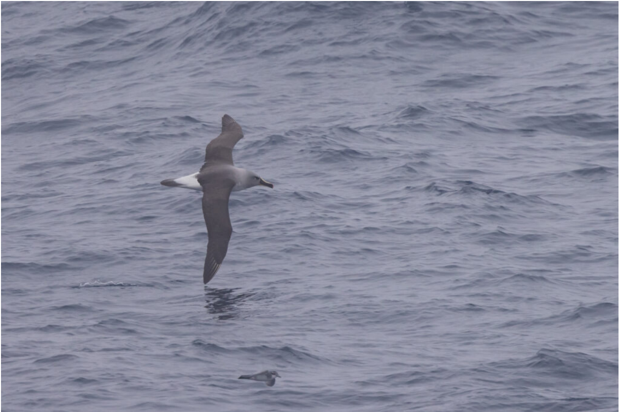
Grey-headed Albatross