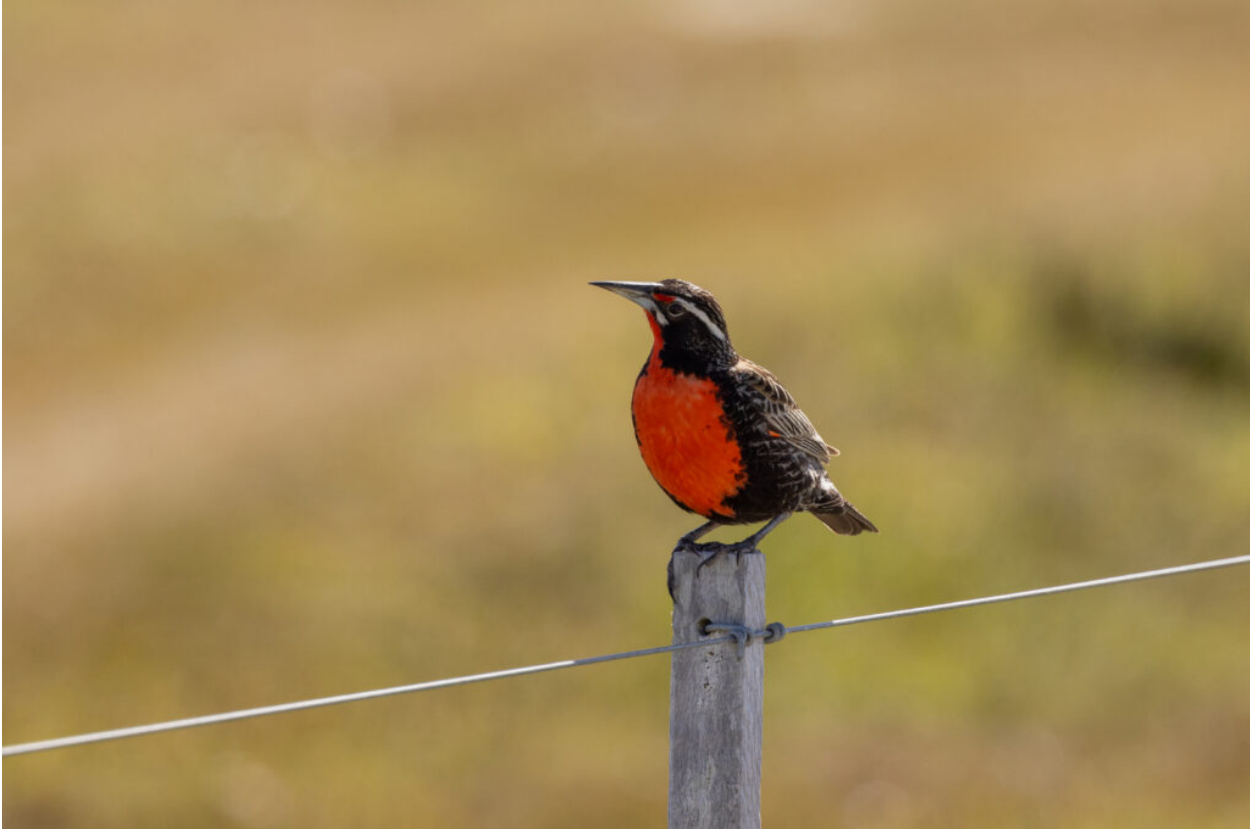
Long-tailed Meadowlark