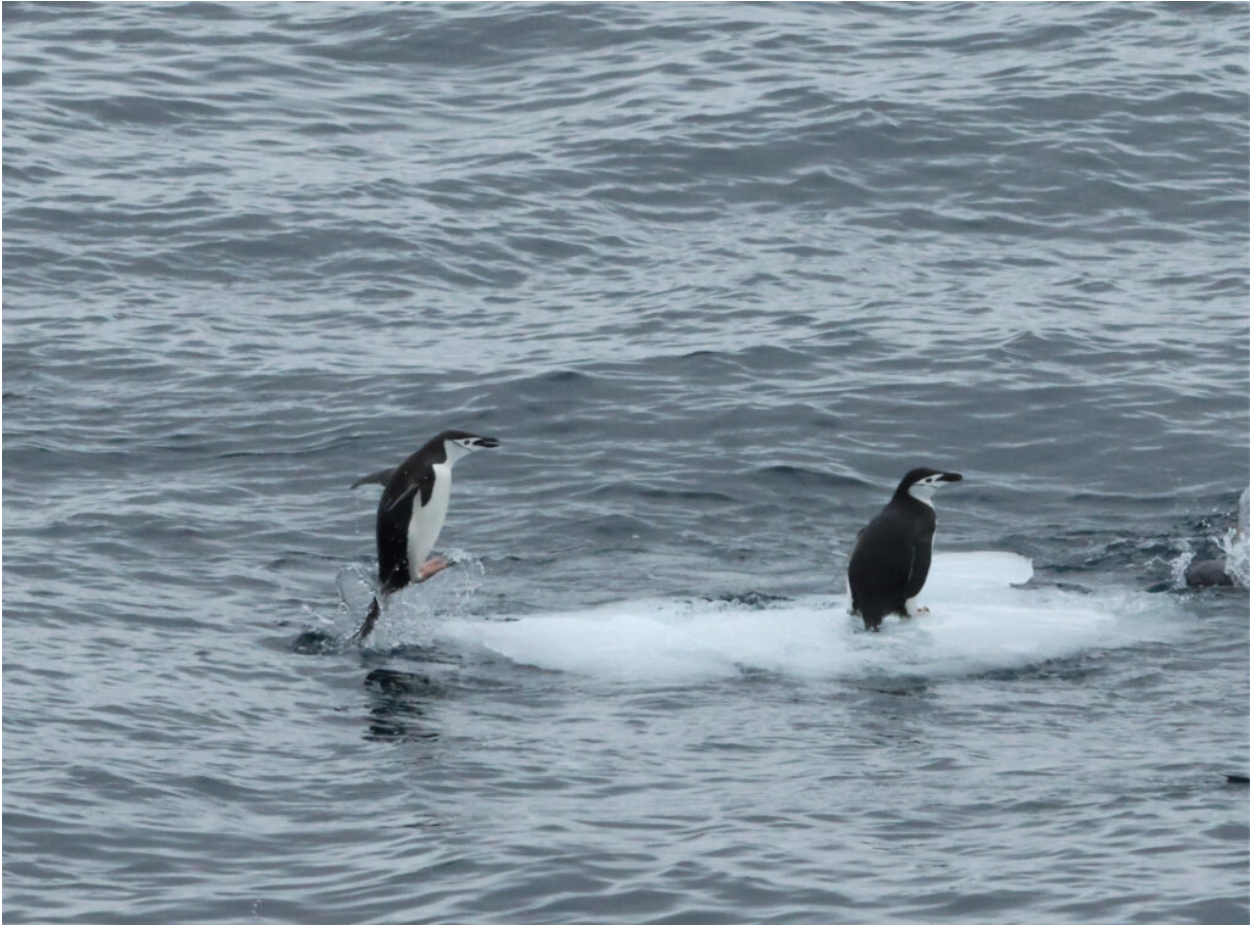
Chinstrap Penguin nailing the landing!