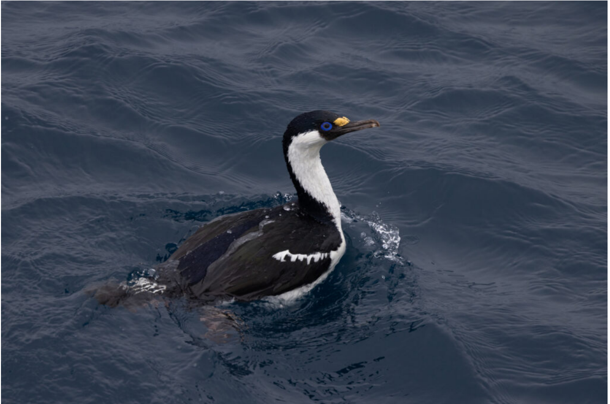
South Georgia Shag