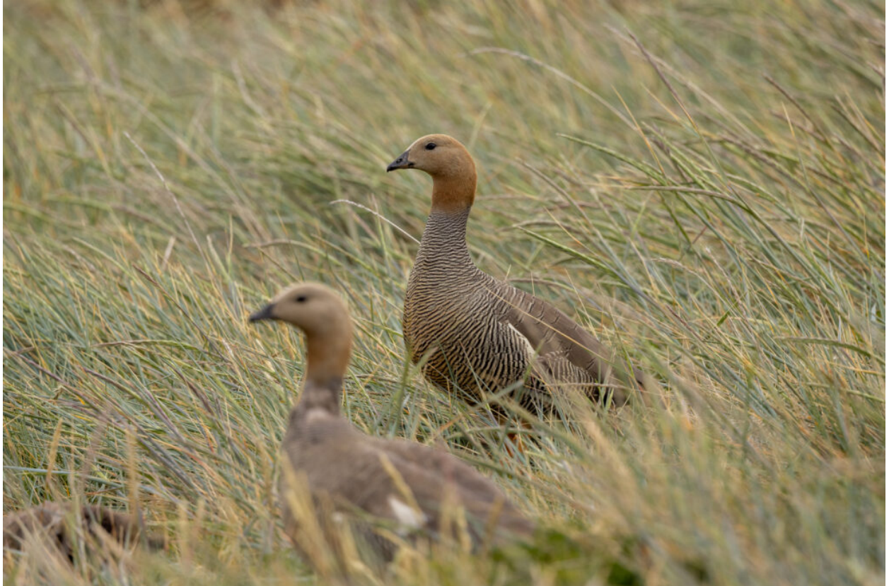
Ruddy-headed Geese