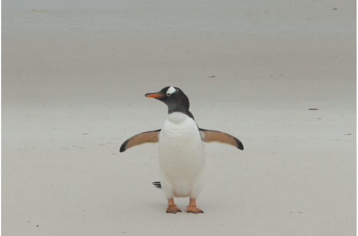
Gentoo Penguin on Falkland beach