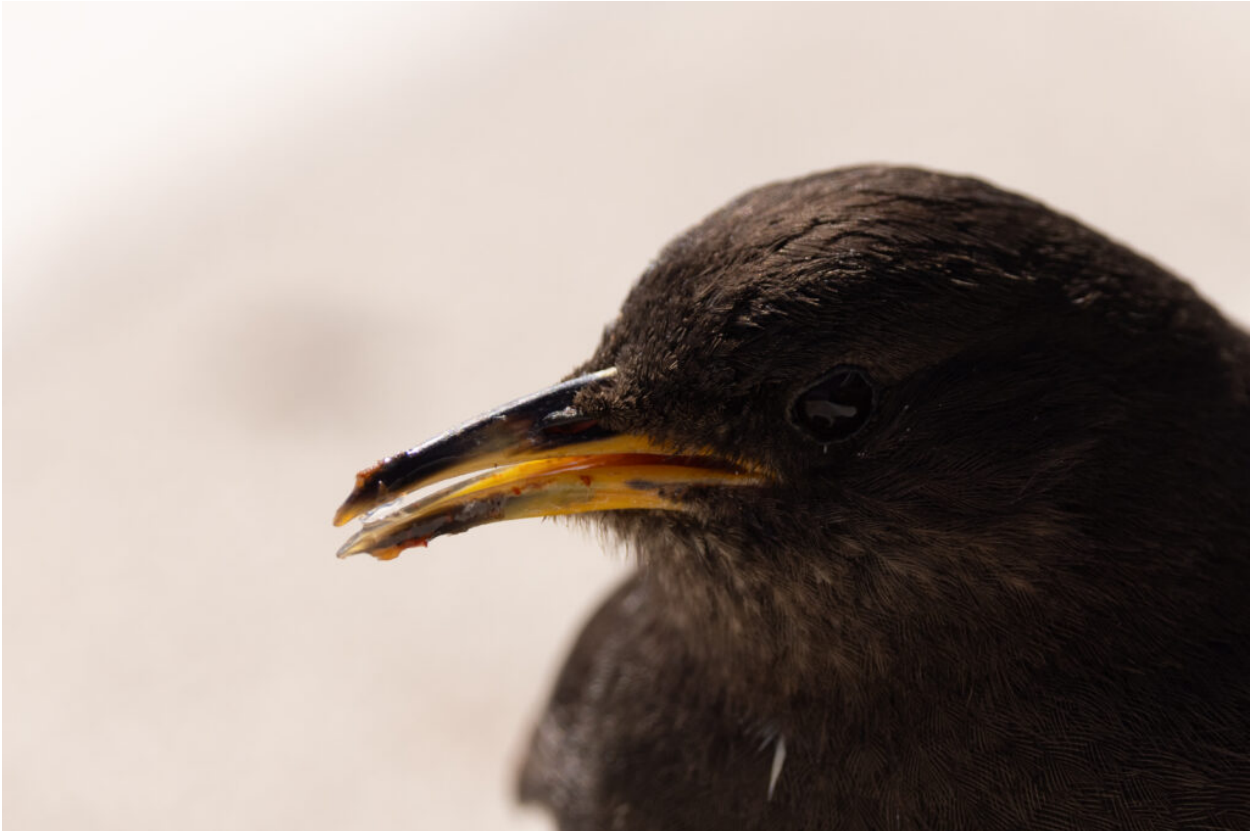
Blackish Cinclodes