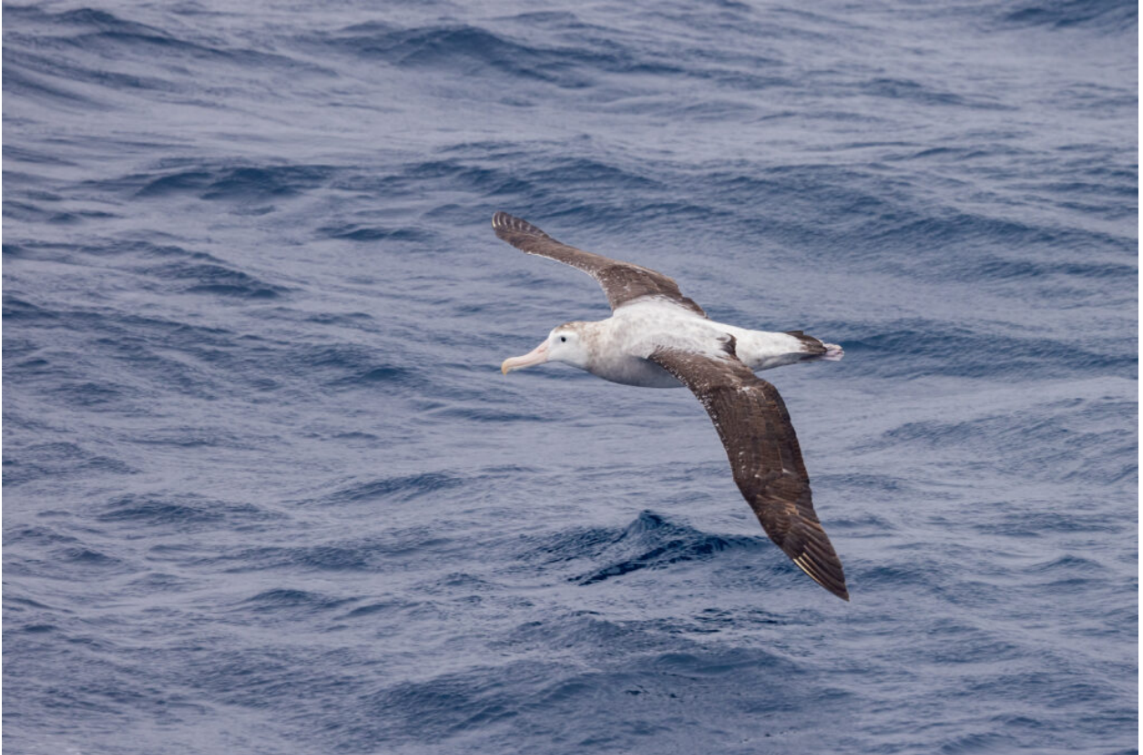
Snowy Albatross