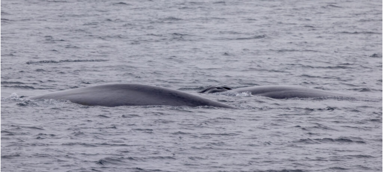
Blue Whales; mum and daughter