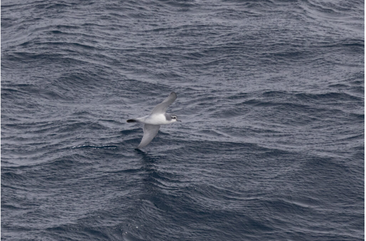
Slender-billed Prion