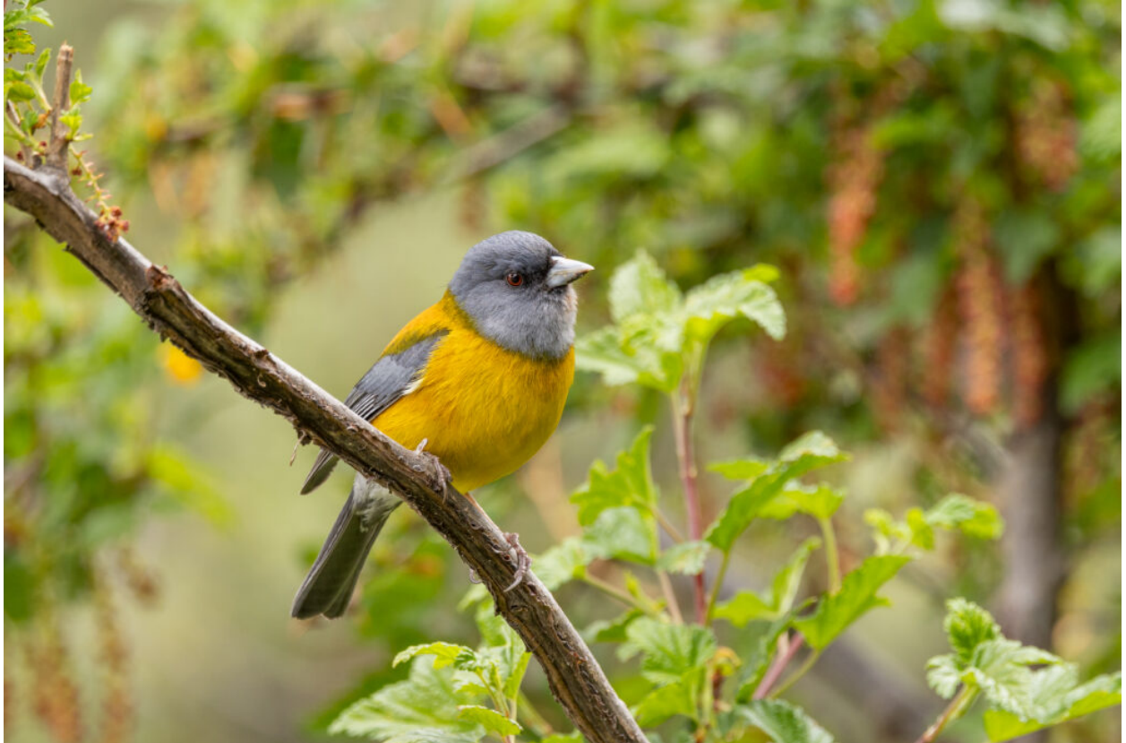
Patagonian Sierra Finch