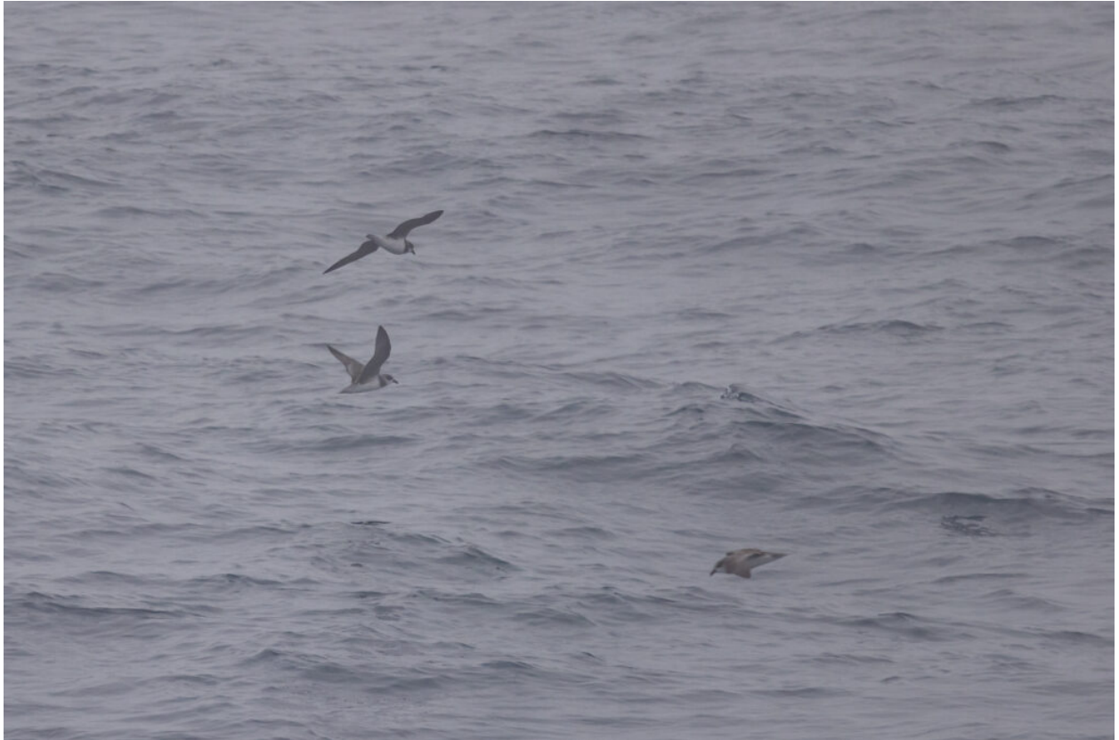
Soft-plumaged Petrel frenzy