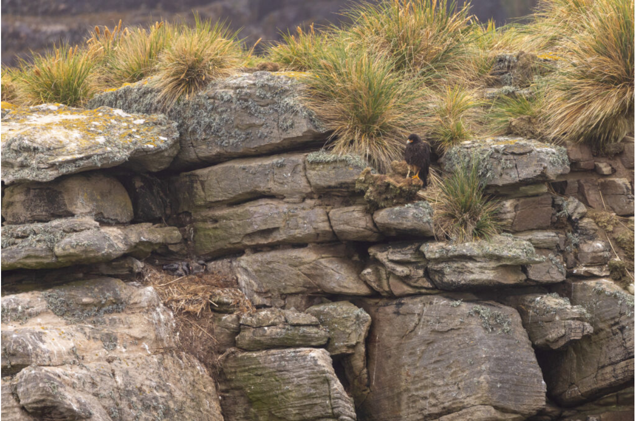
Striated Caracara, with nest (image by Mike Galtry)