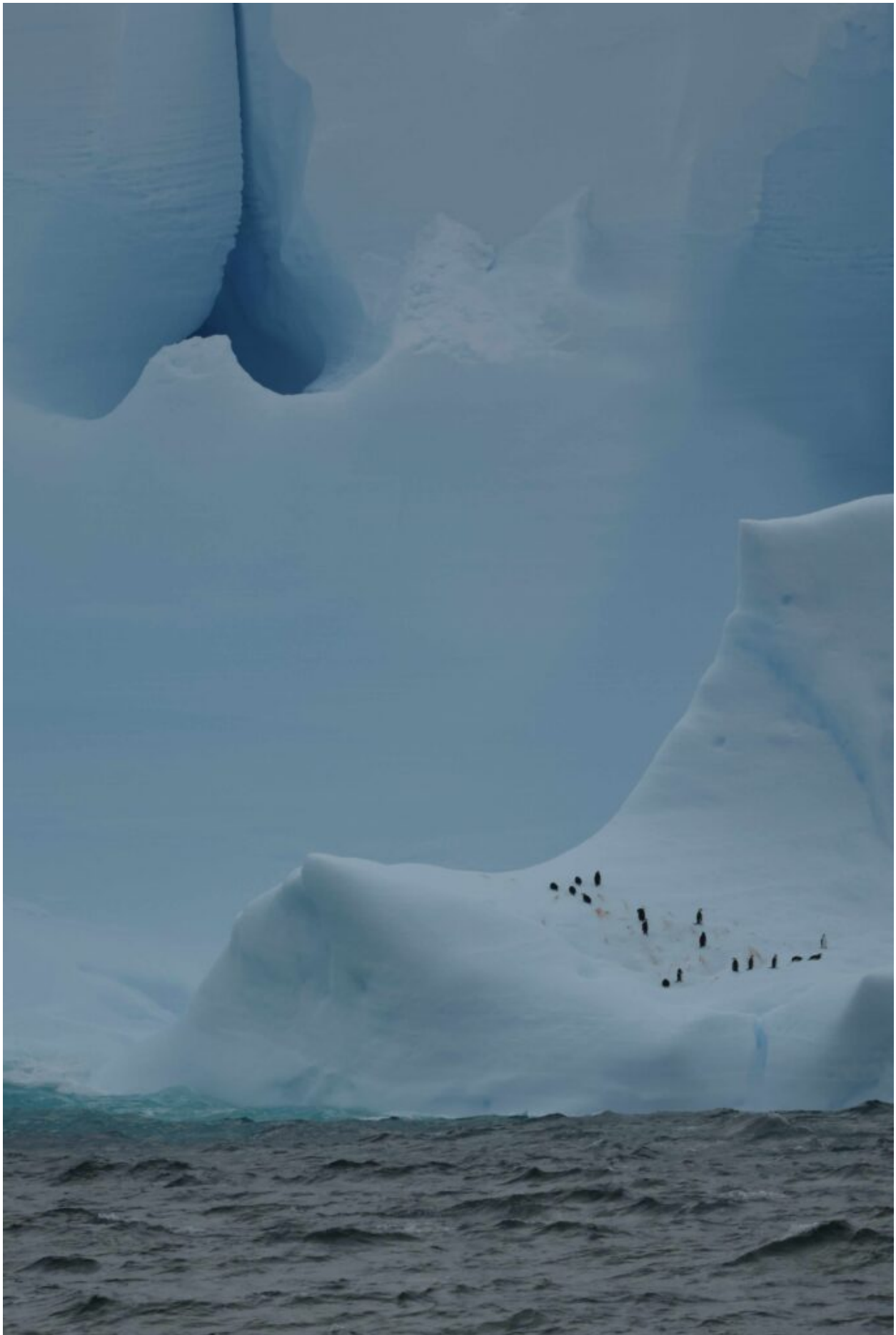
Chinstrap Penguins