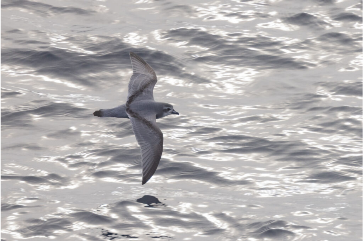
Antarctic Prion