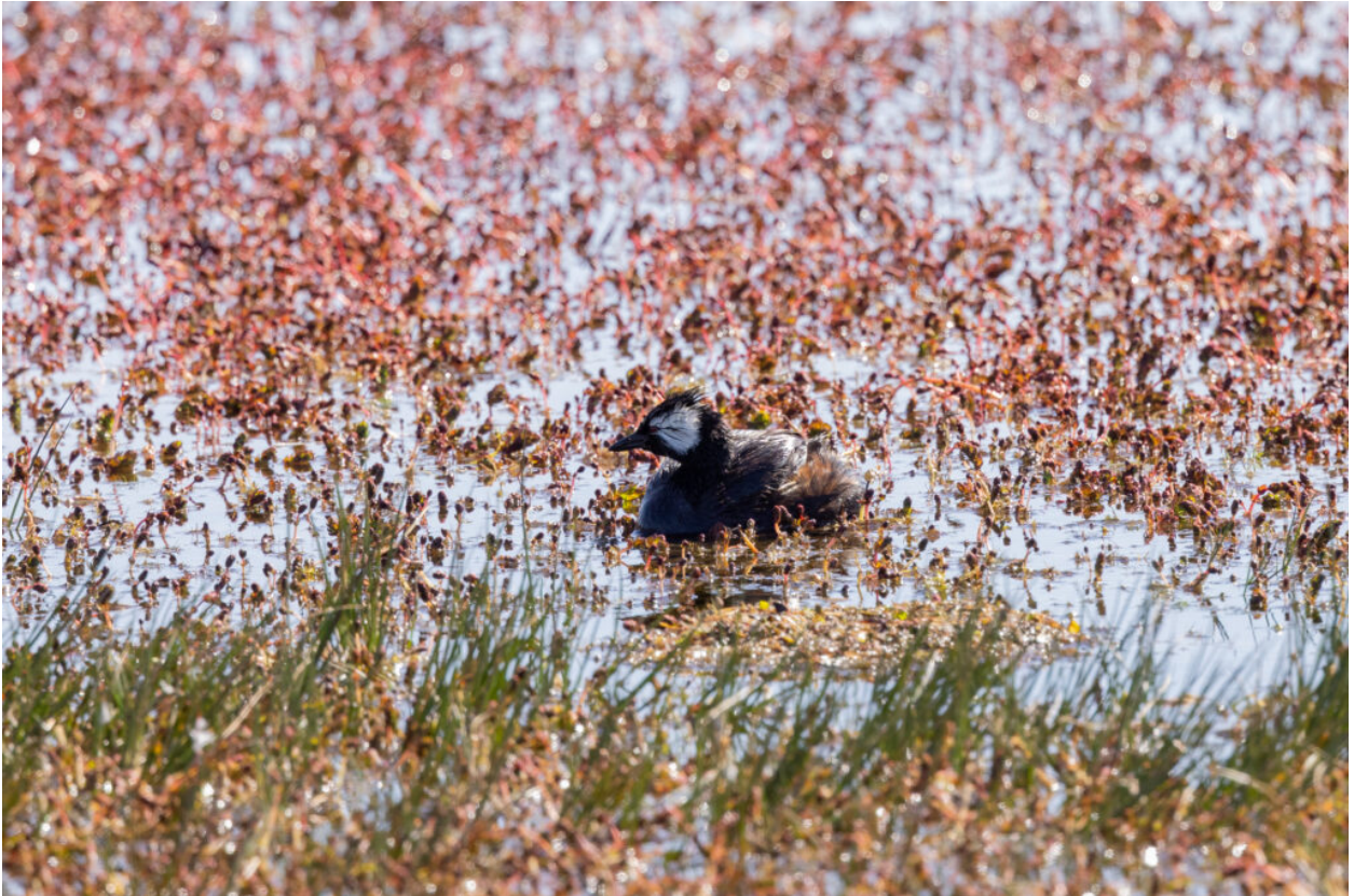
White-tufted Grebe ssp rolland