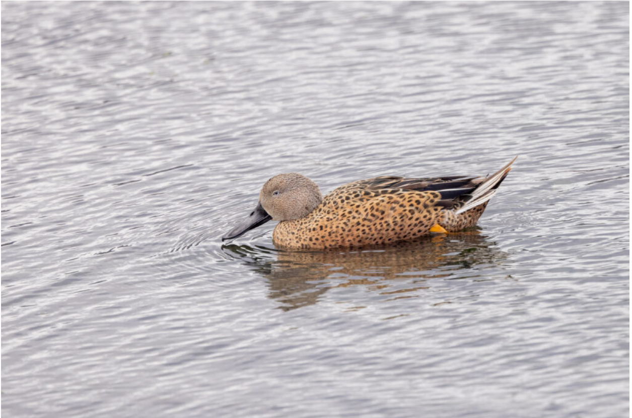
Red Shoveler