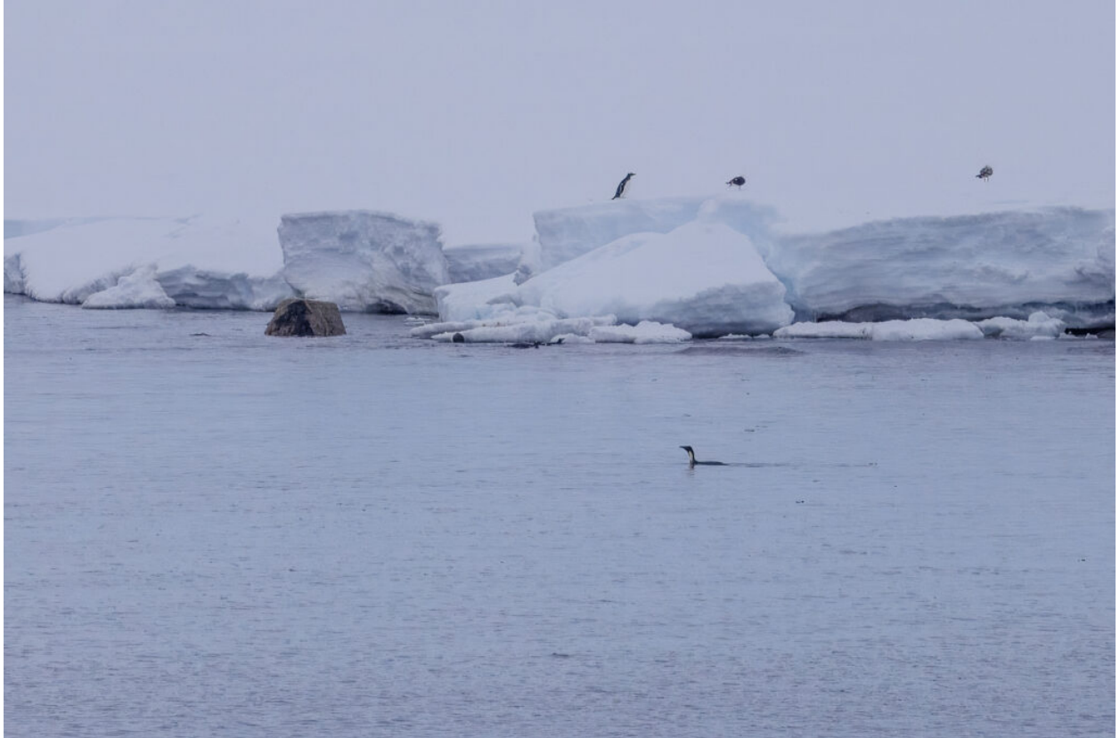
Emperor Penguin