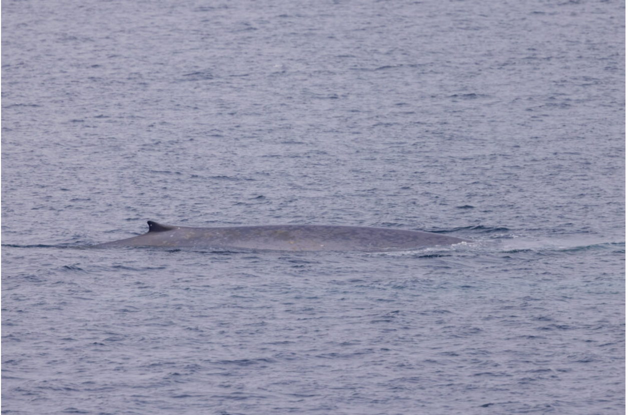
Blue Whale