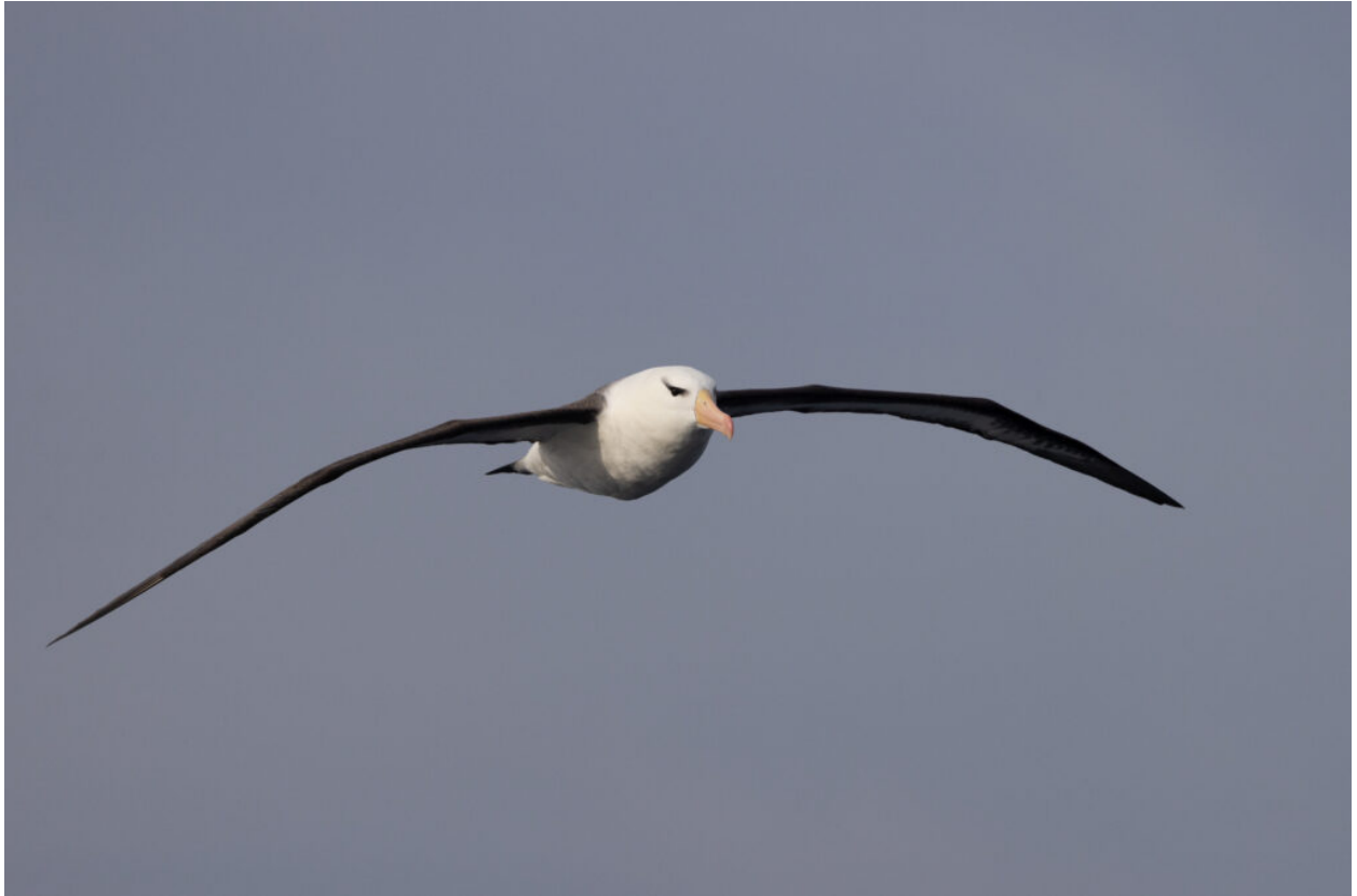
Black-browed Albatross