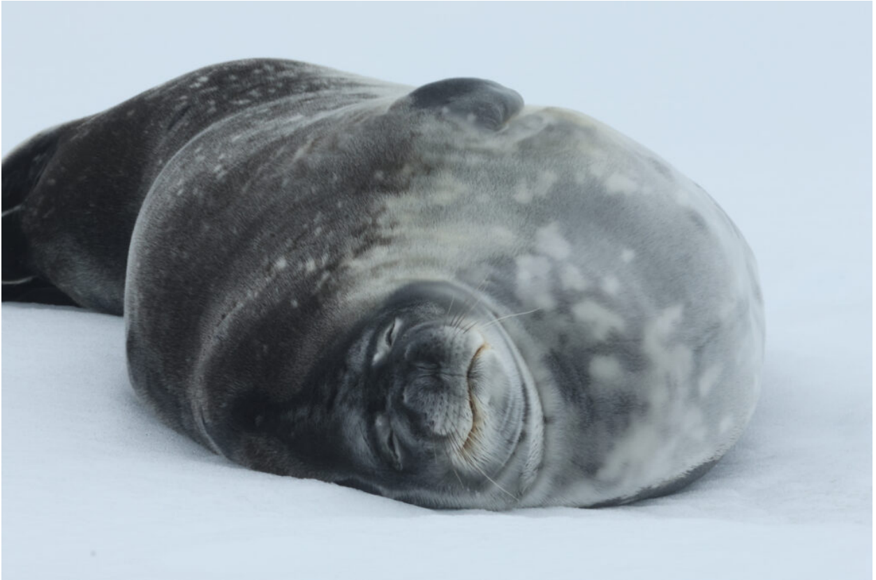
Weddell Seal