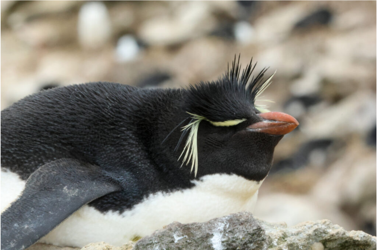
Southern Rockhopper Penguin