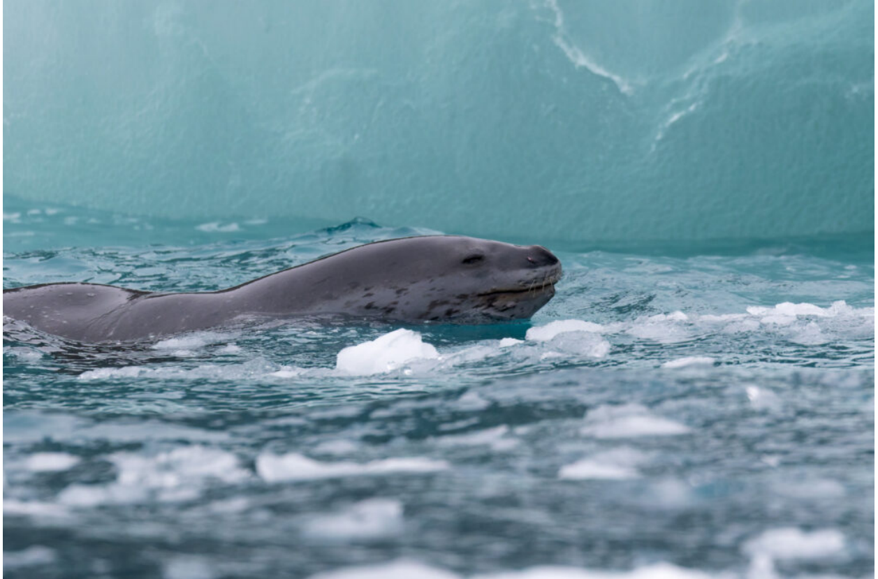
Leopard Seal