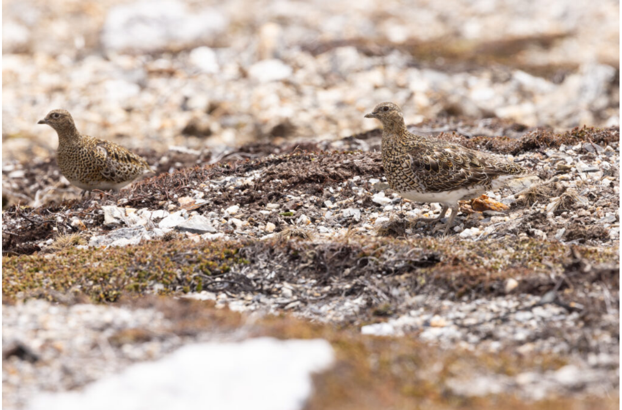
White-bellied Seedsnipes