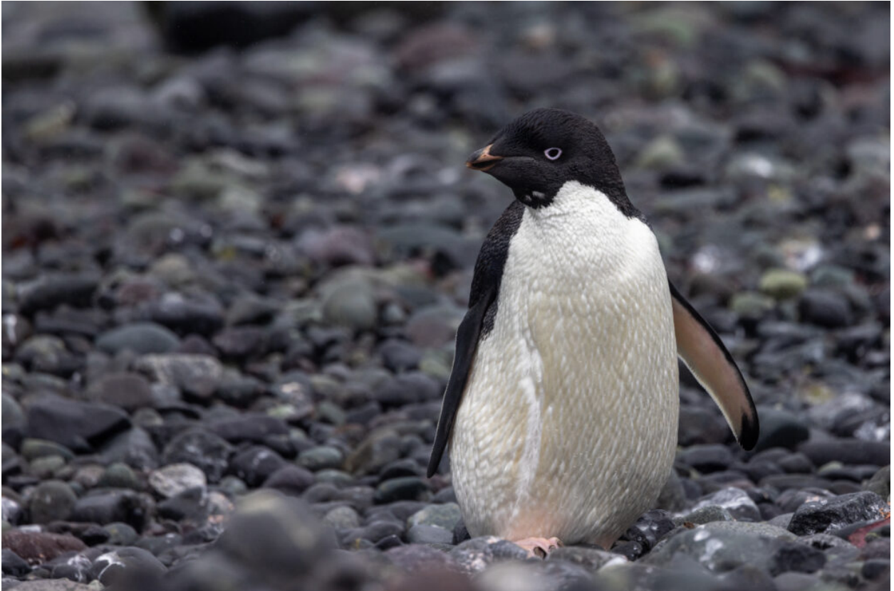
Adélie Penguin