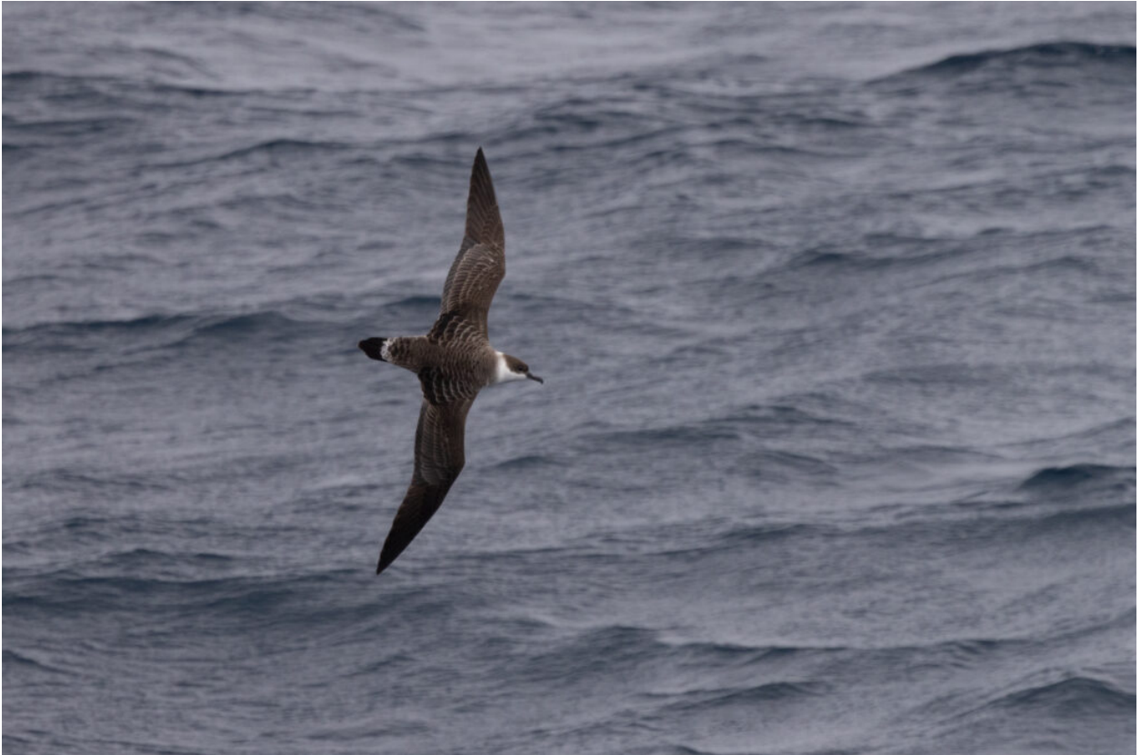
Great Shearwater