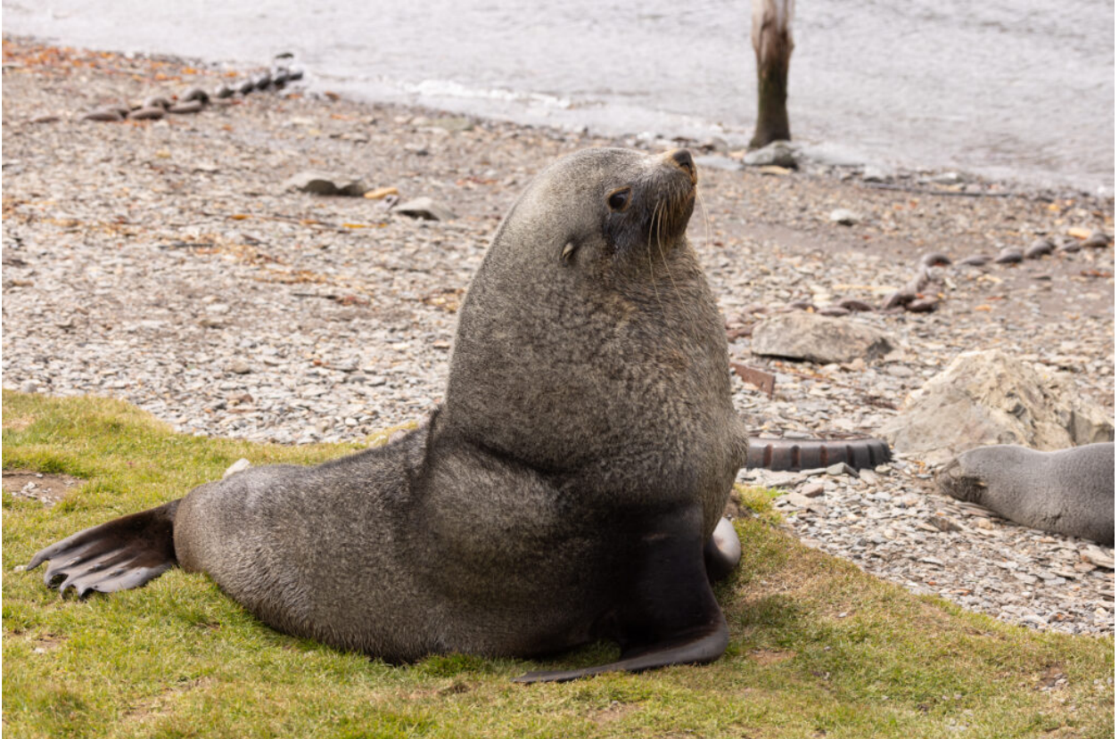
Antarctic Fur Seal