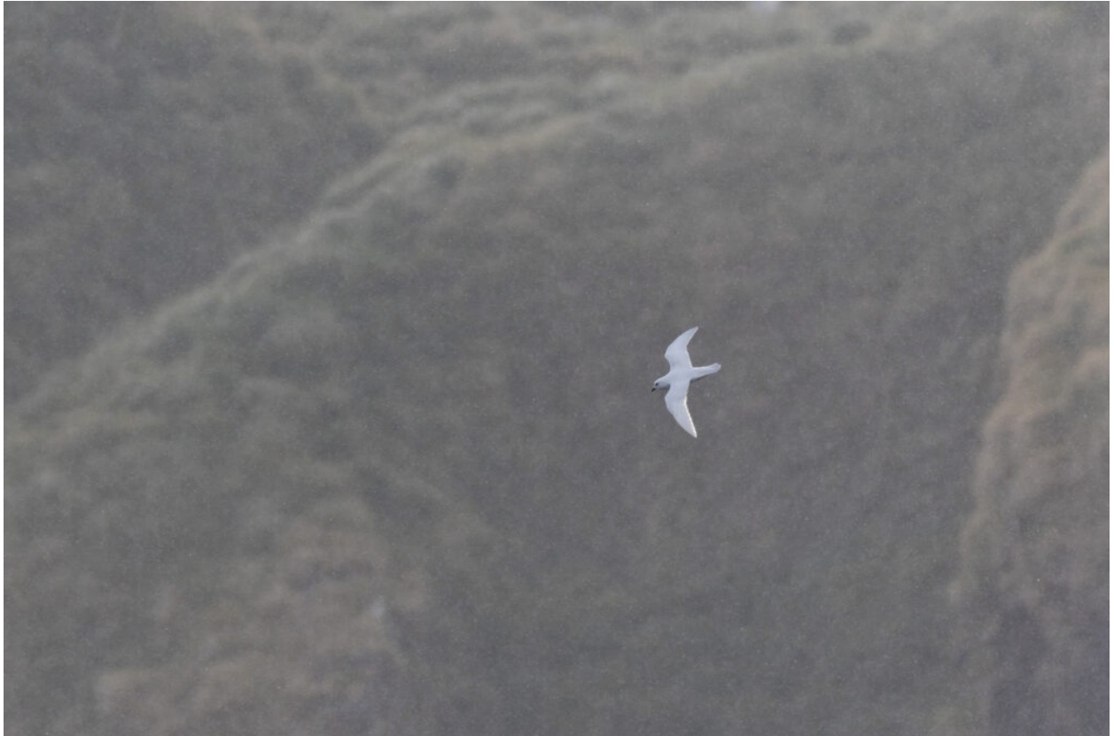
Snow Petrel