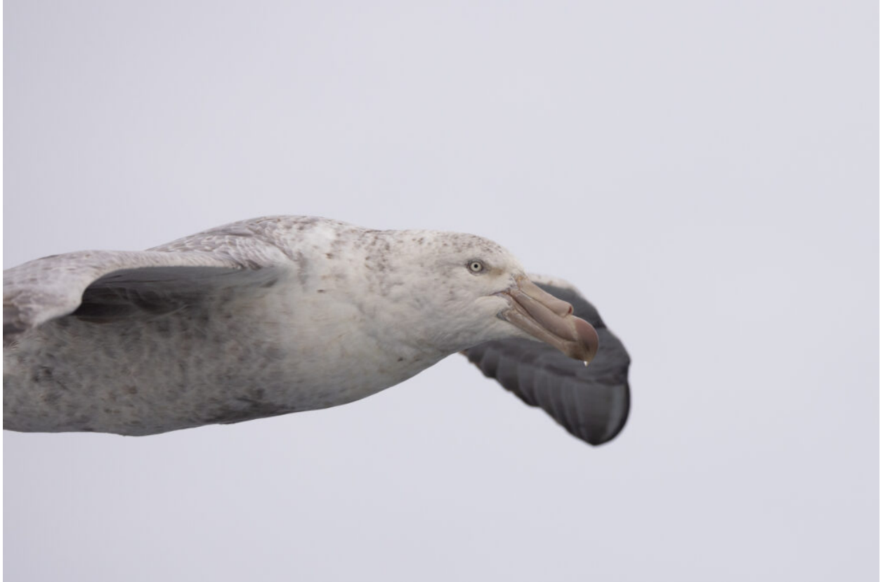
Northern Giant Petrel