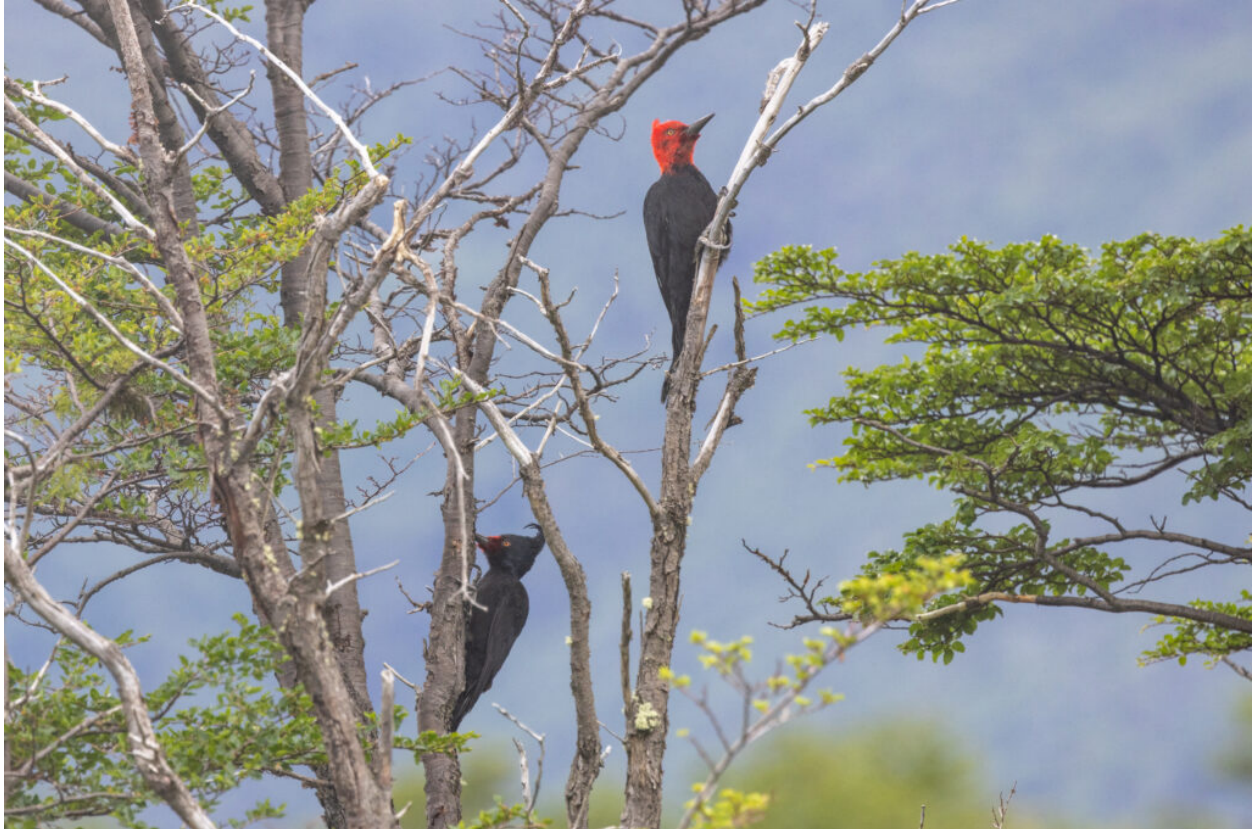
Magellanic Woodpeckers