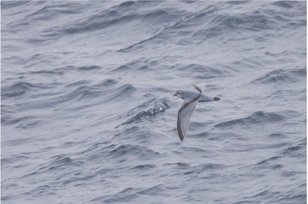
Fairy Prion