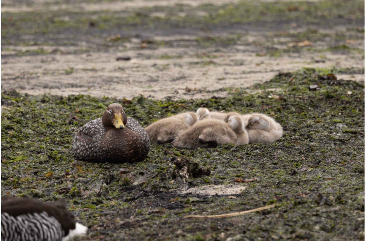
Mother Falkland Steamer Duck with ducklings