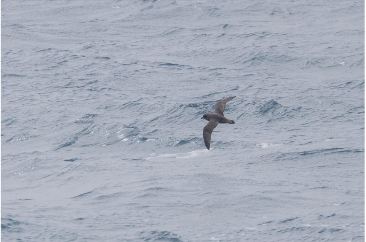
Kerguelen Petrel