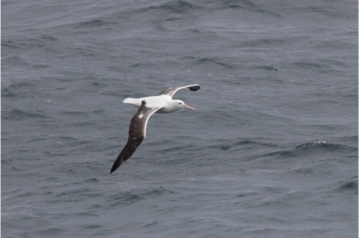
Southern Royal Albatross