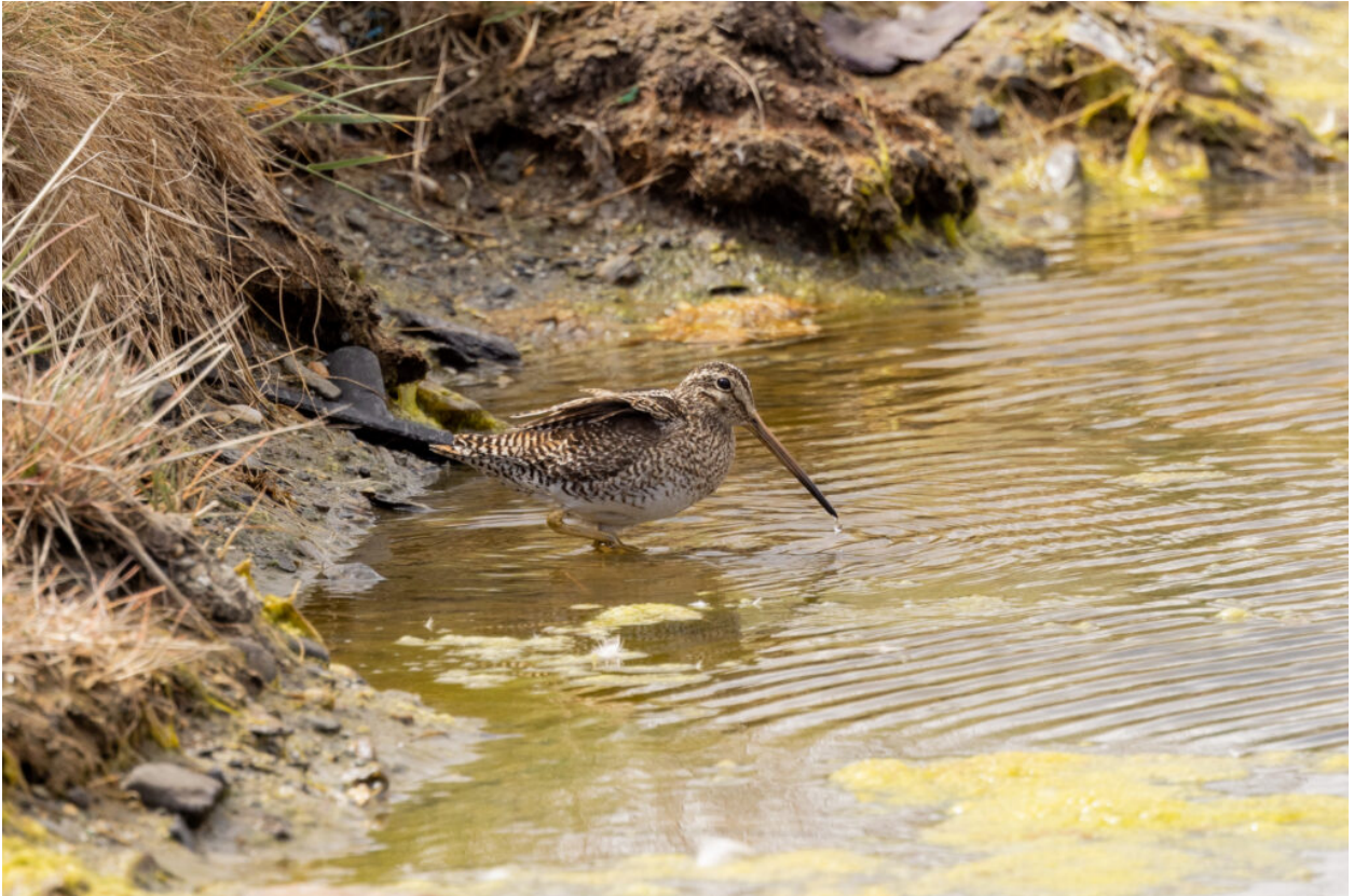
Magellanic Snipe