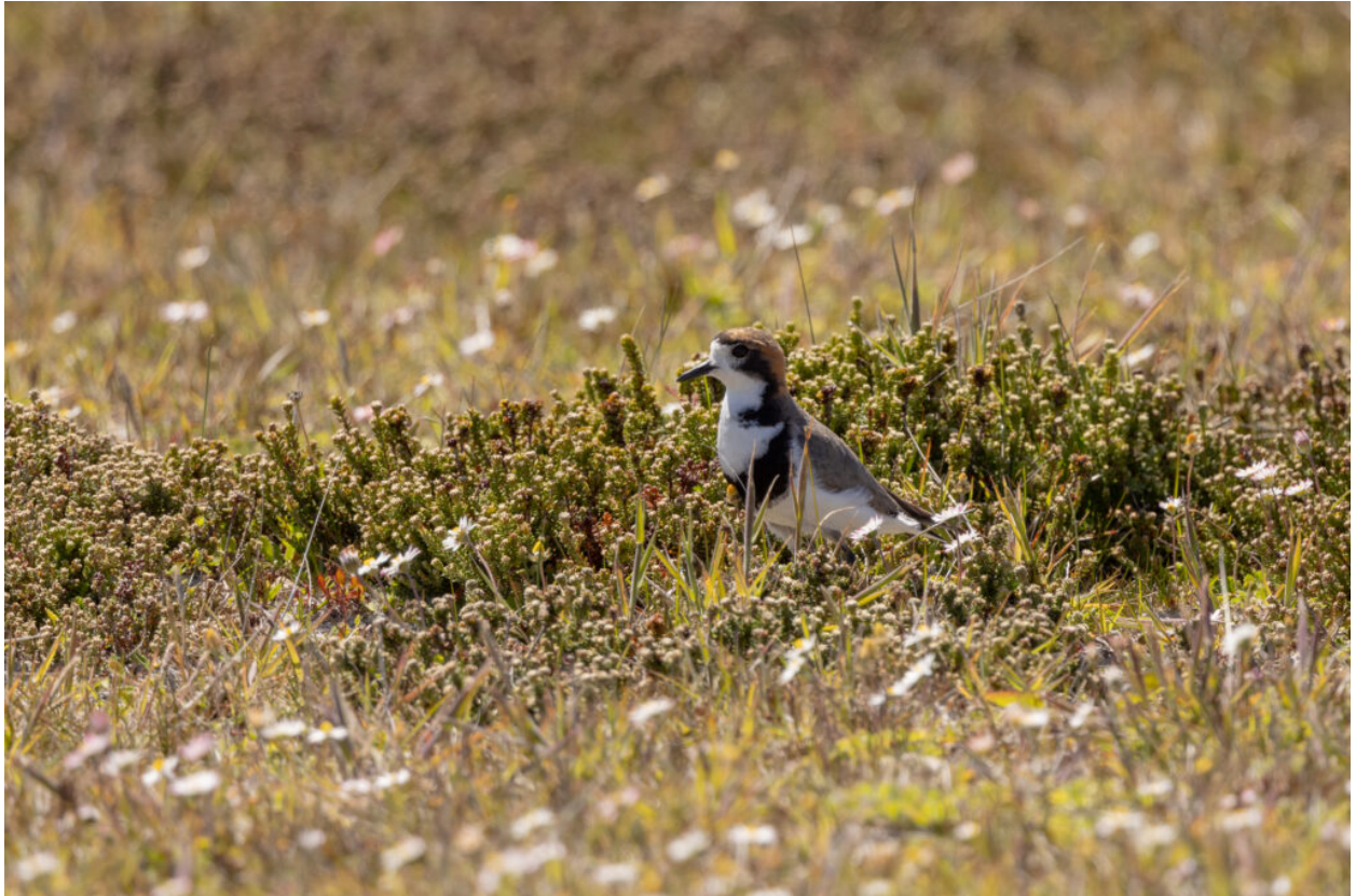
Two-banded Plover