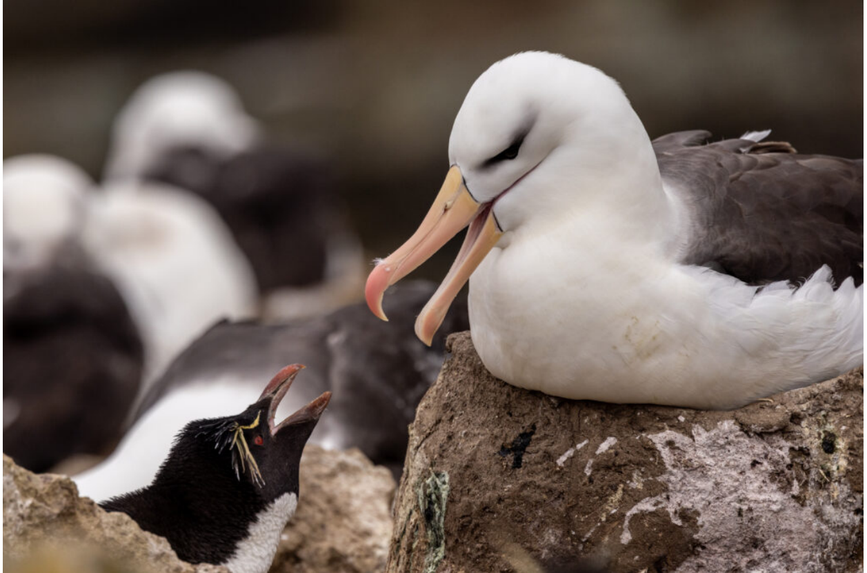
Black-browed Albatross (image by Mike Galtry)