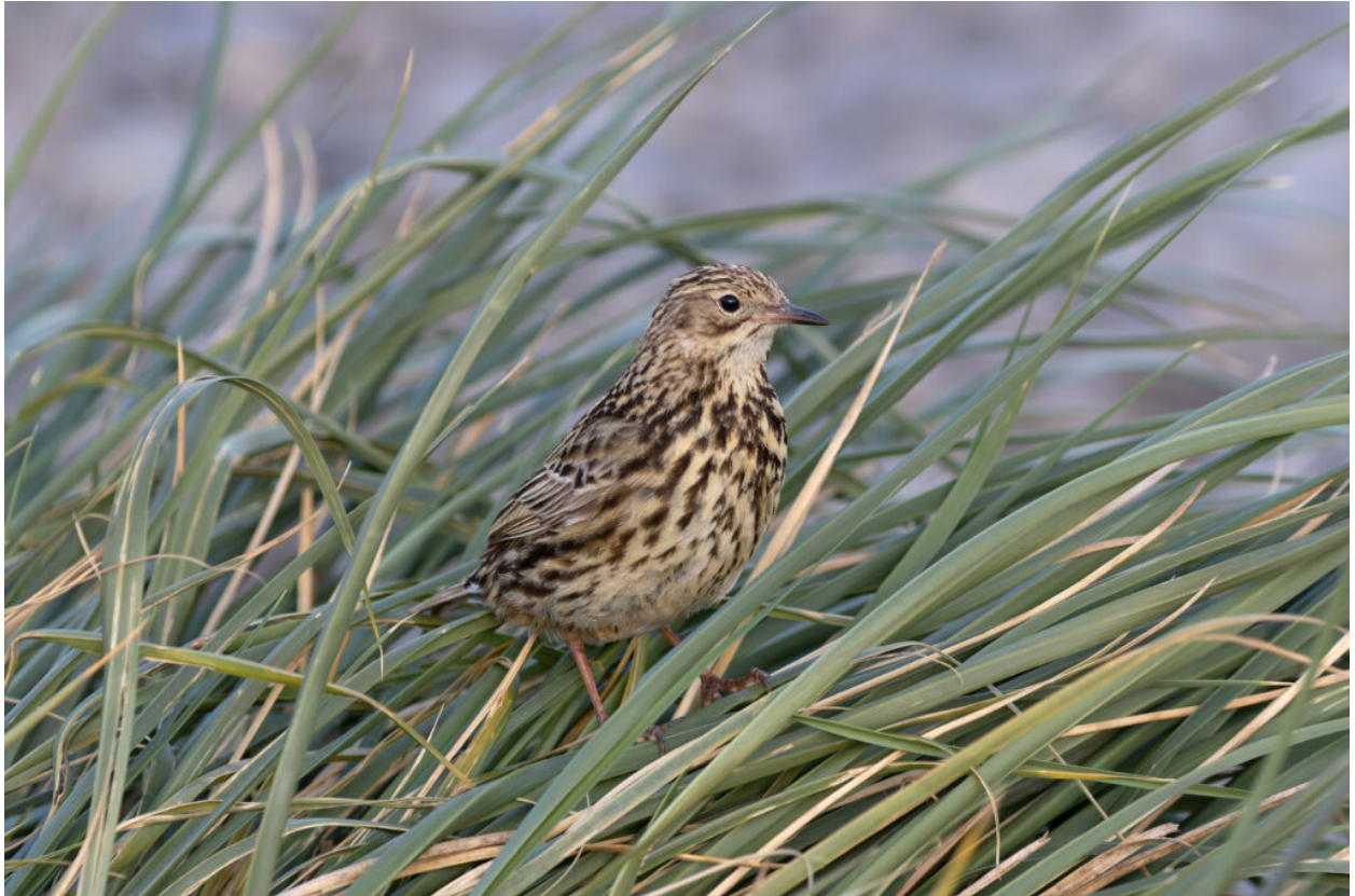
South Georgia Pipit