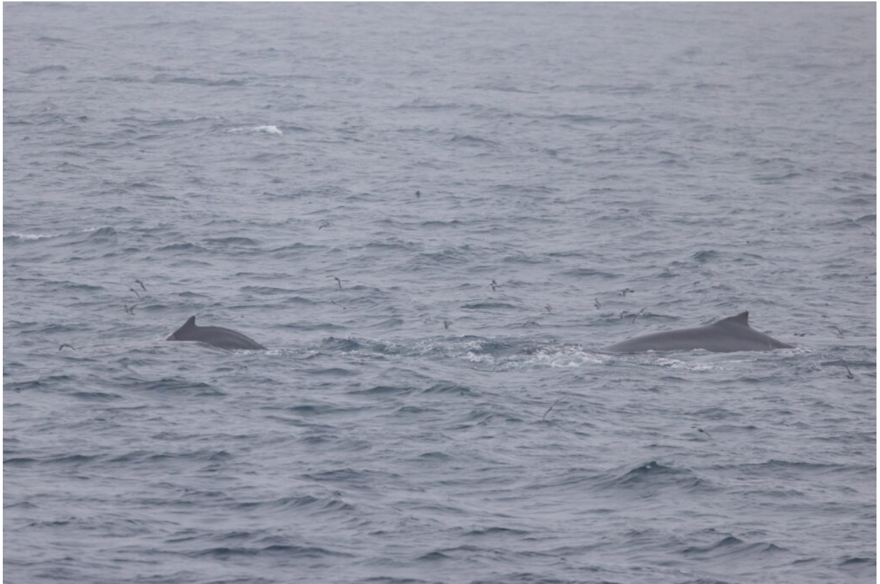
Feeding frenzy with Humpback Whales

Cape Horn, on our way back to Ushuaia