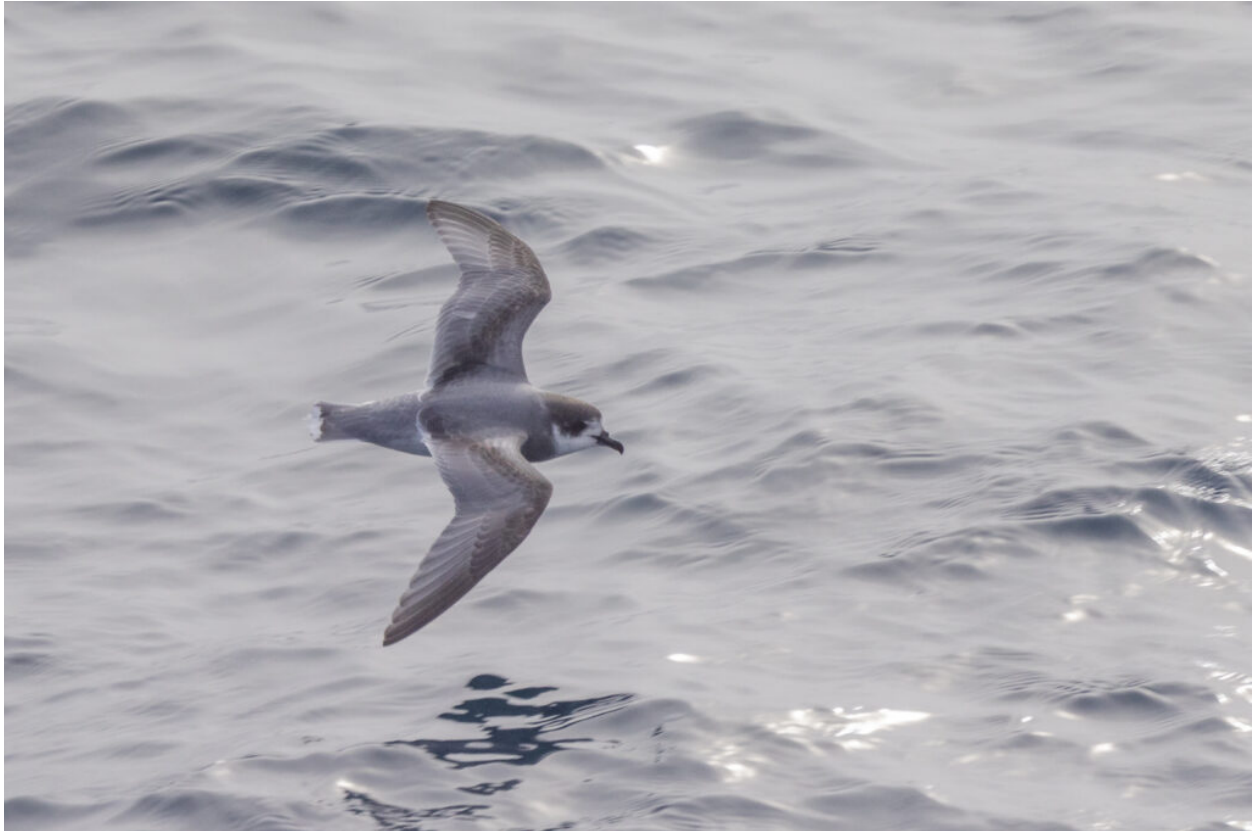
Blue Petrel