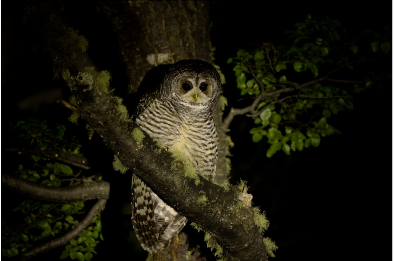
Rufous-legged Owl (image by Mike Galtry)