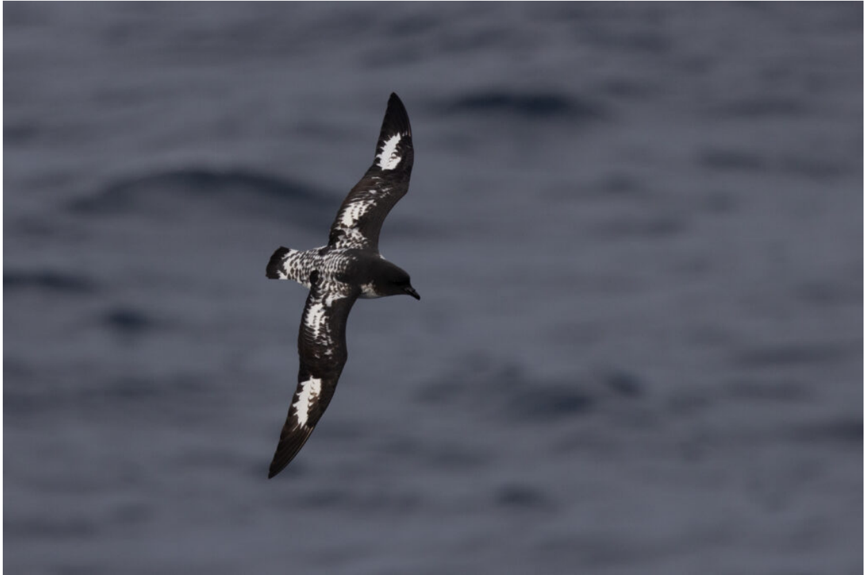
Cape Petrel