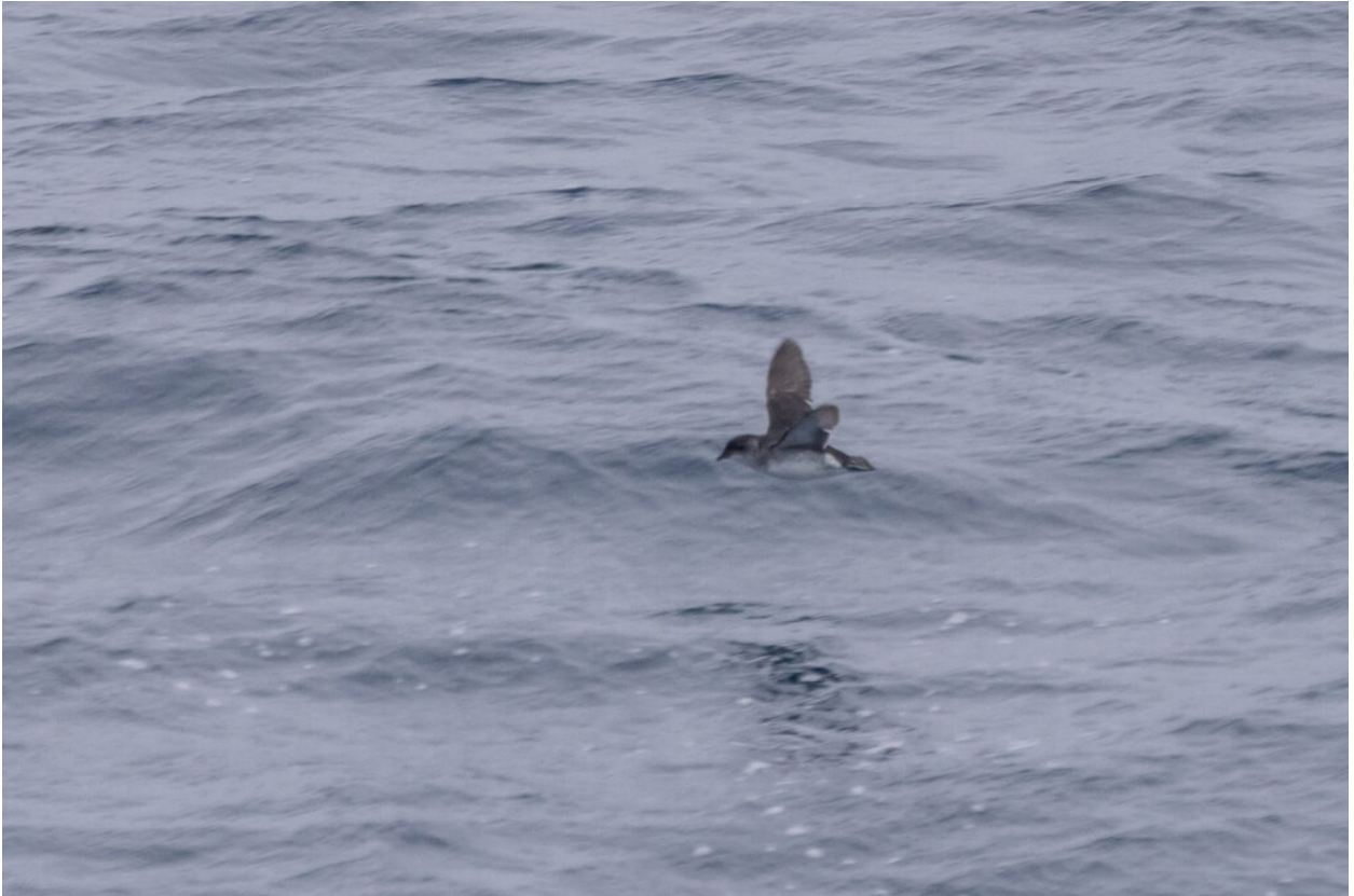
South Georgia Diving-petrel