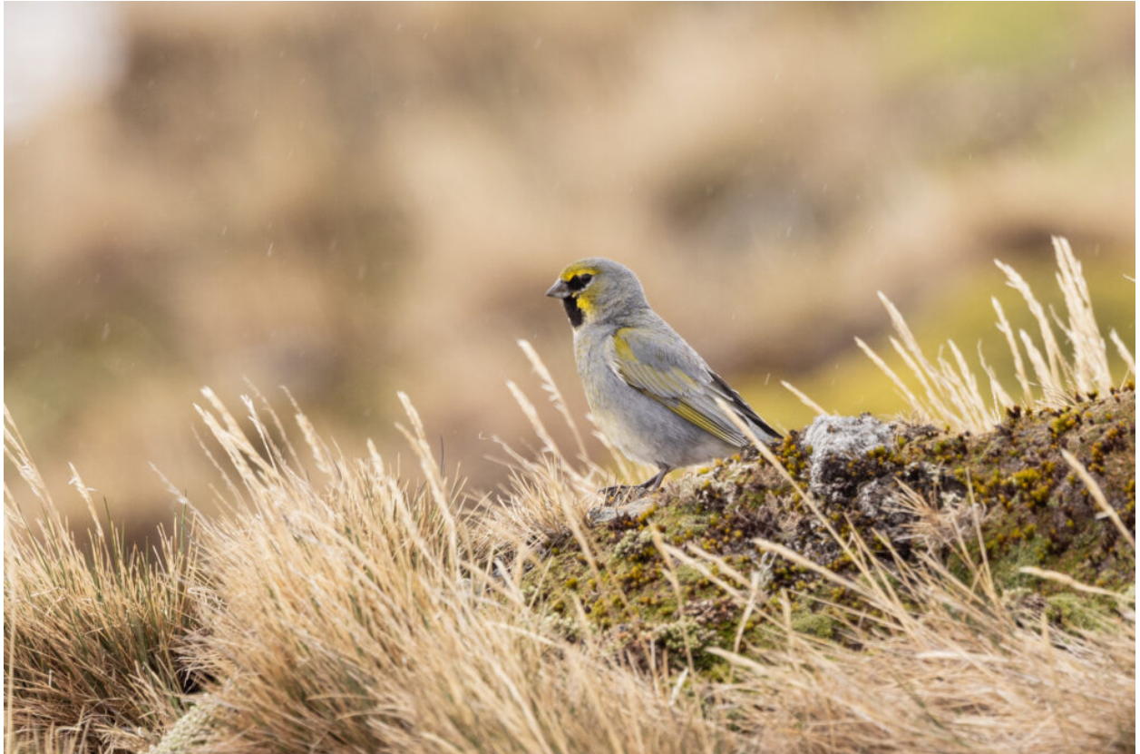
Yellow-bridled Finch