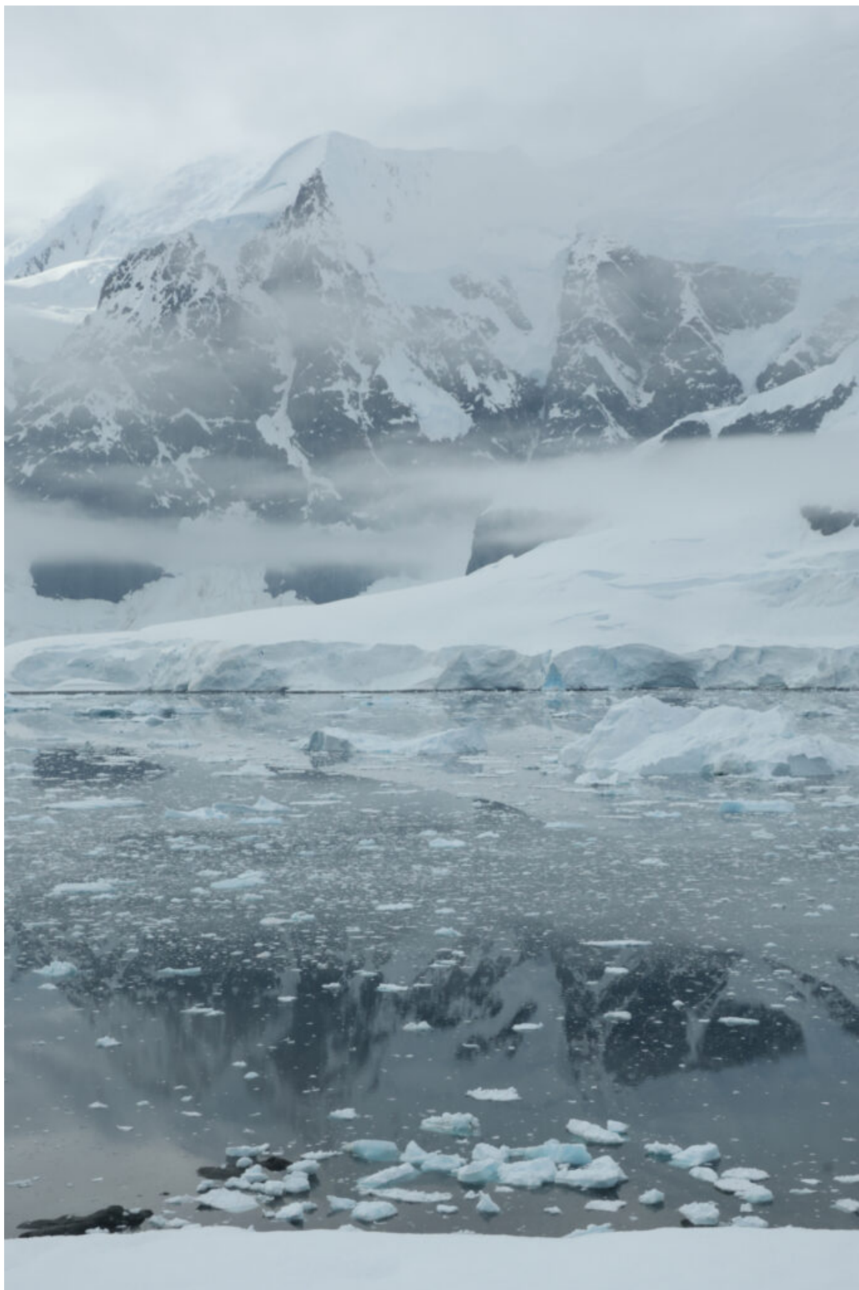
Antarctica on Christmas Day