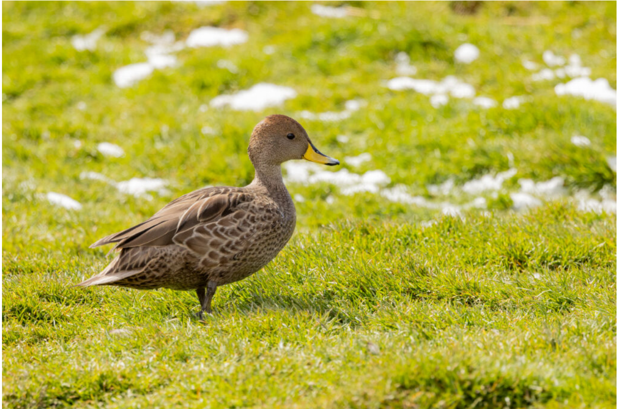
South Georgia Pintail