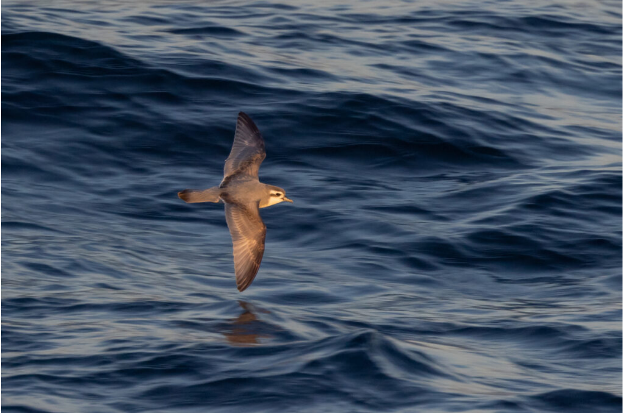
Slender-billed Prion