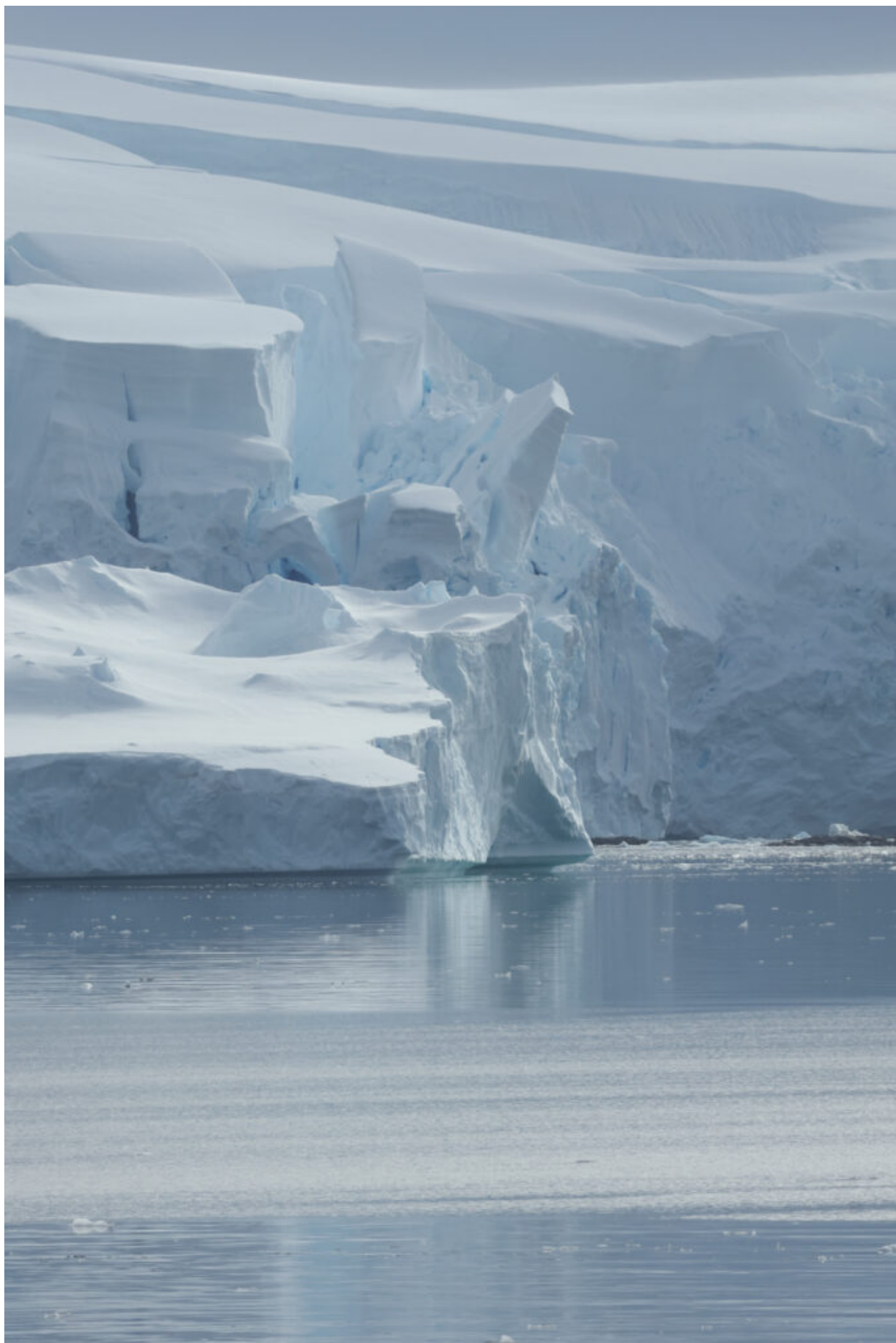
Ice, ready to tumble!