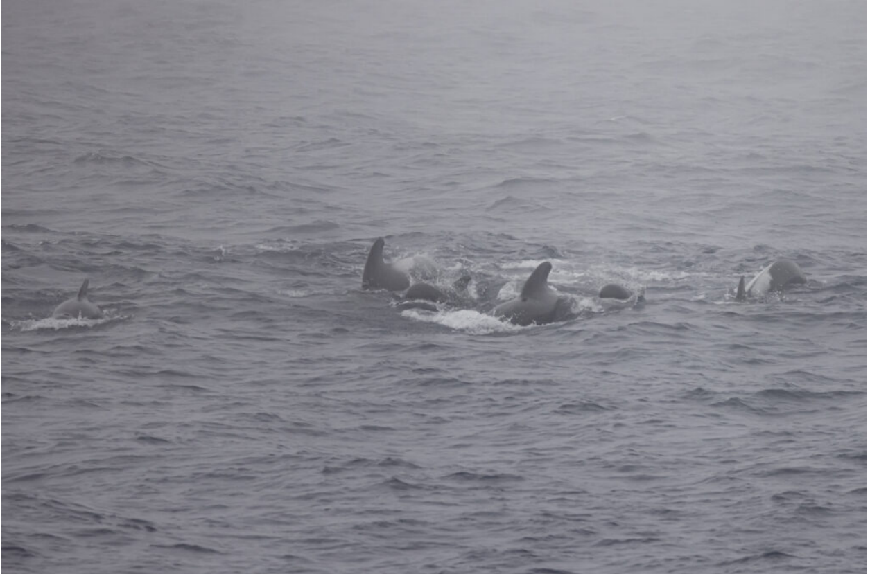
Long-finned Pilot Whale