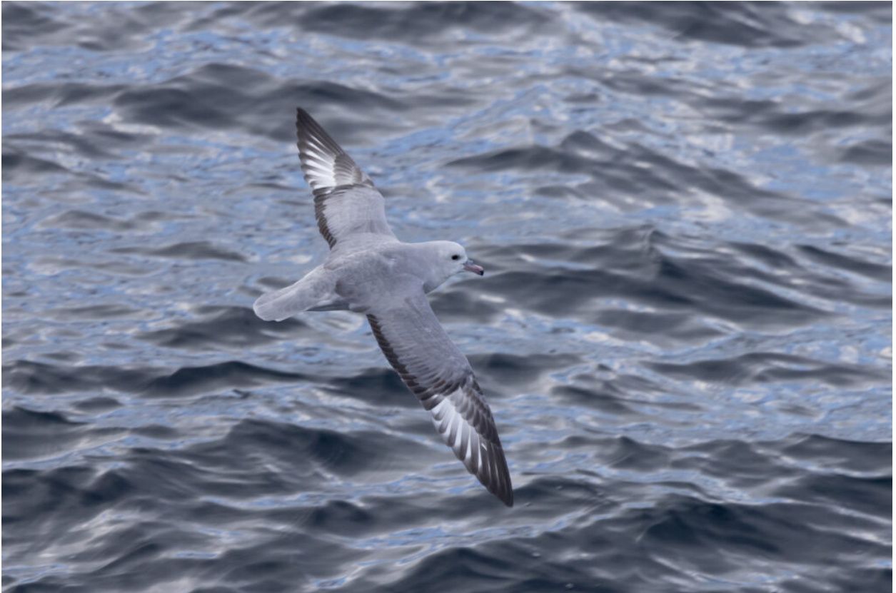
Southern Fulmar