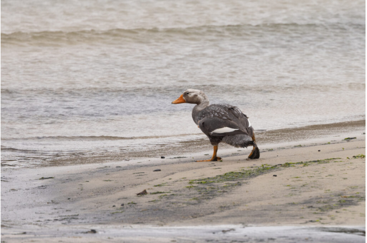
Falkland Steamer Duck