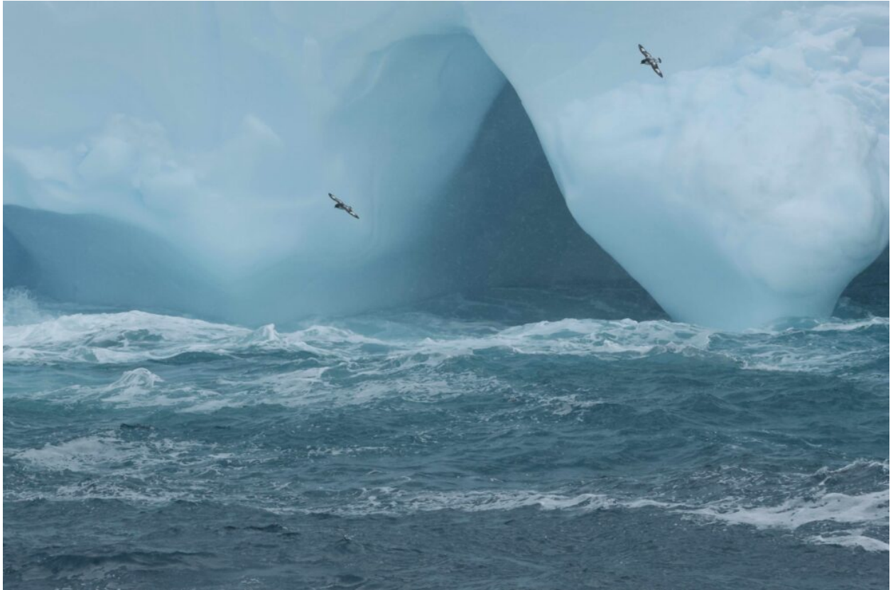
Cape Petrels at the world's largest iceberg, A23a