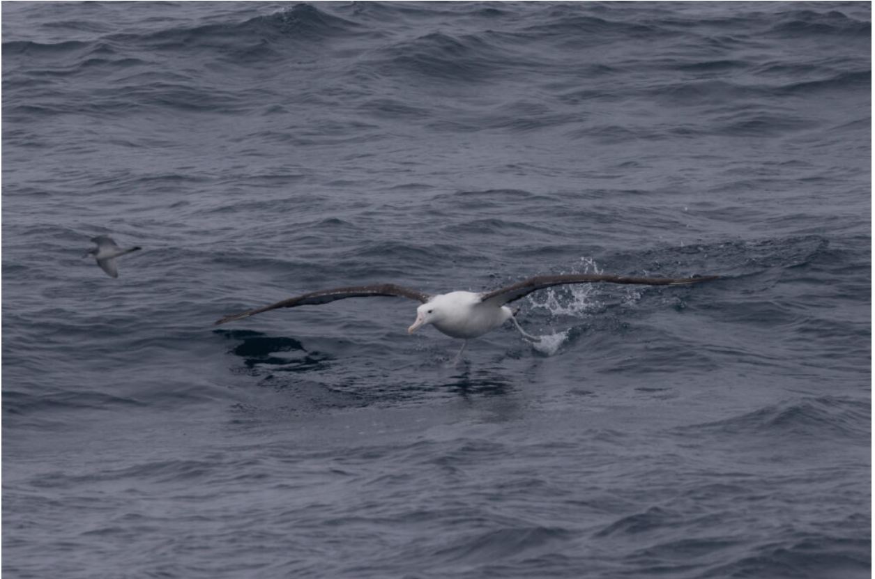
Northern Royal Albatross