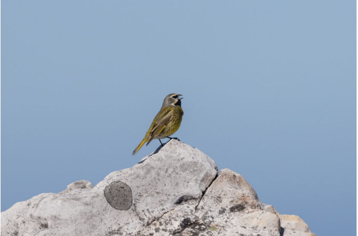
White-bridled Finch