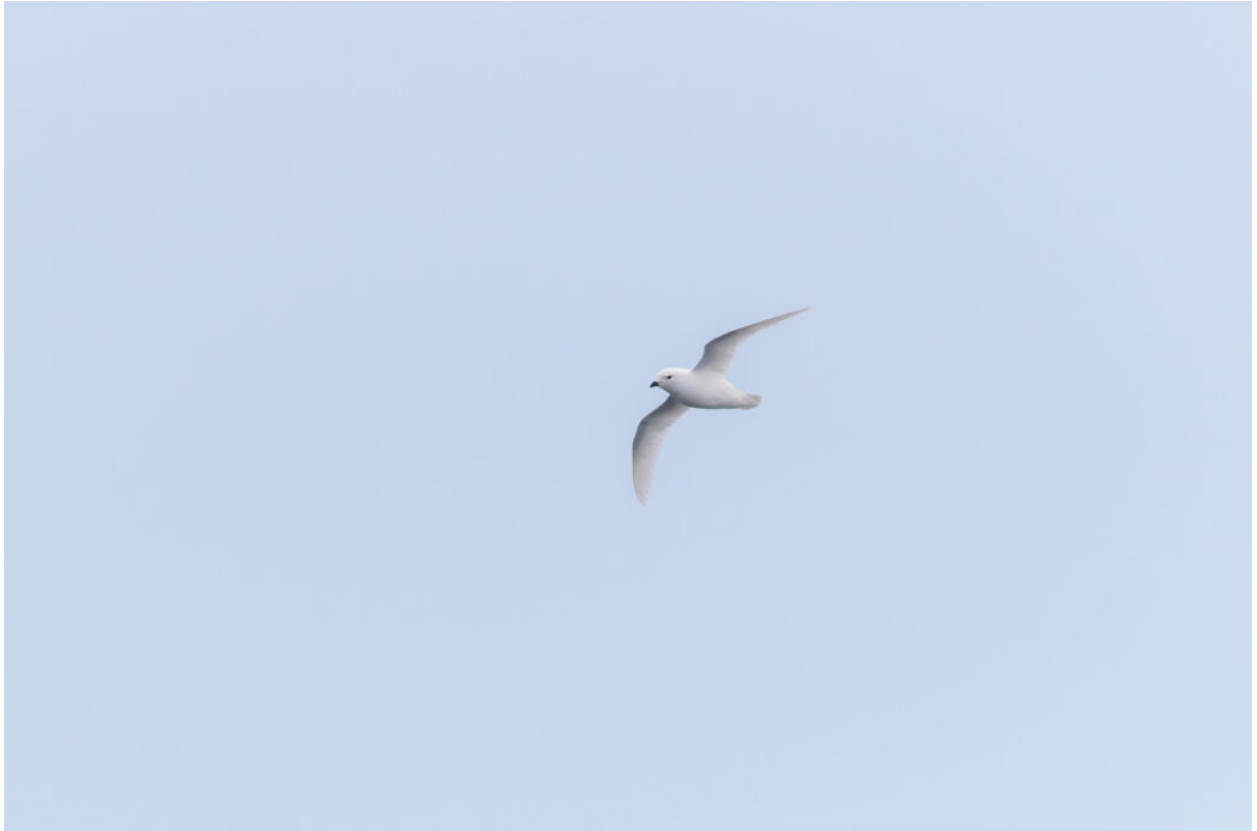
Snow Petrel