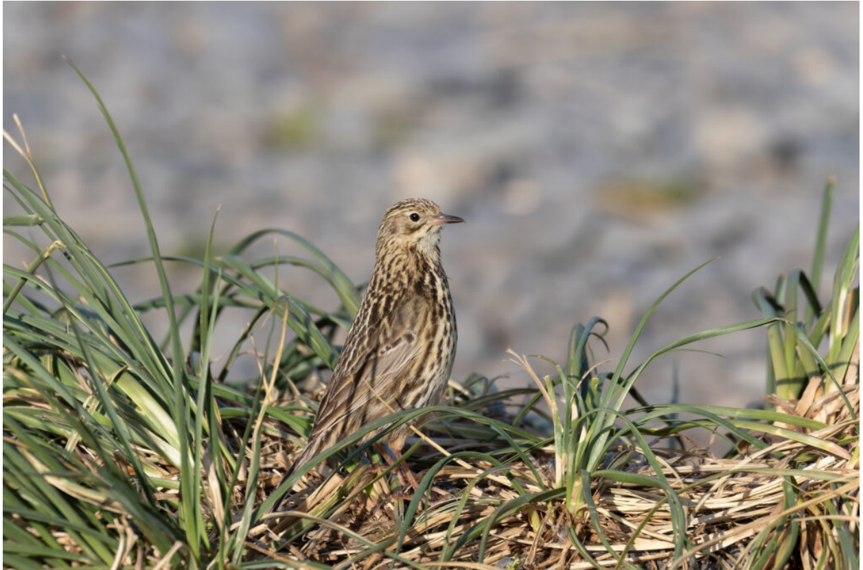
South Georgia Pipit