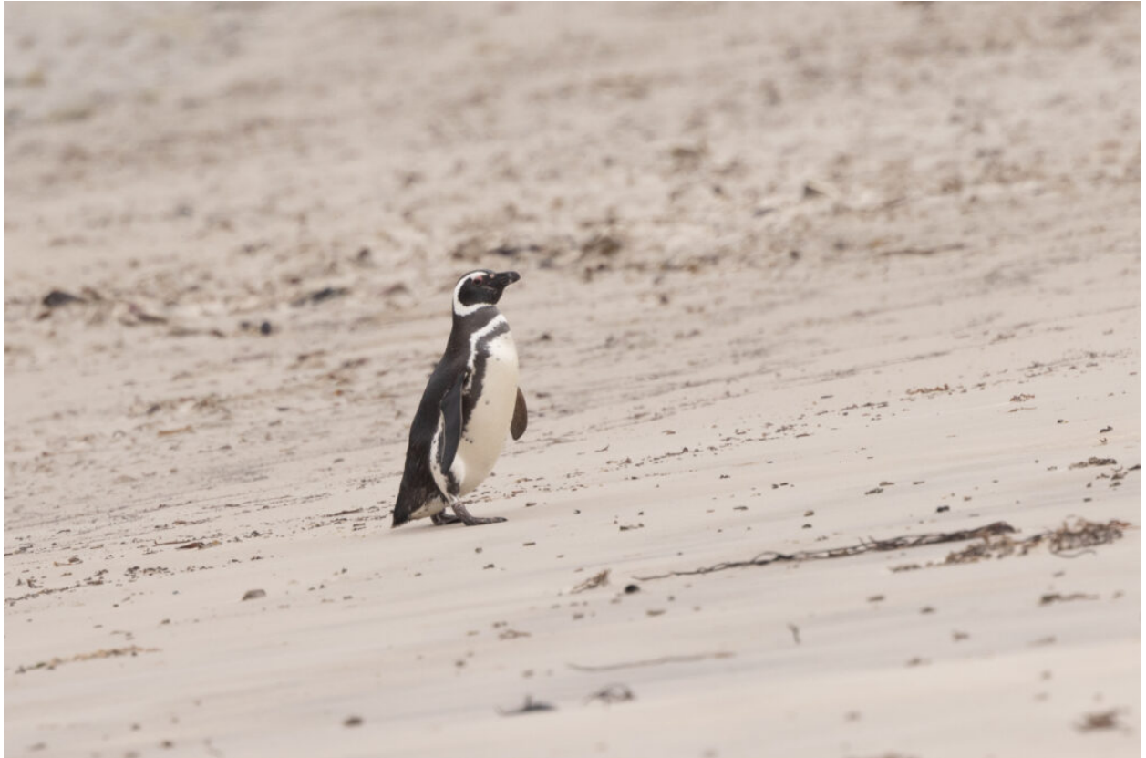
Magellanic Penguin