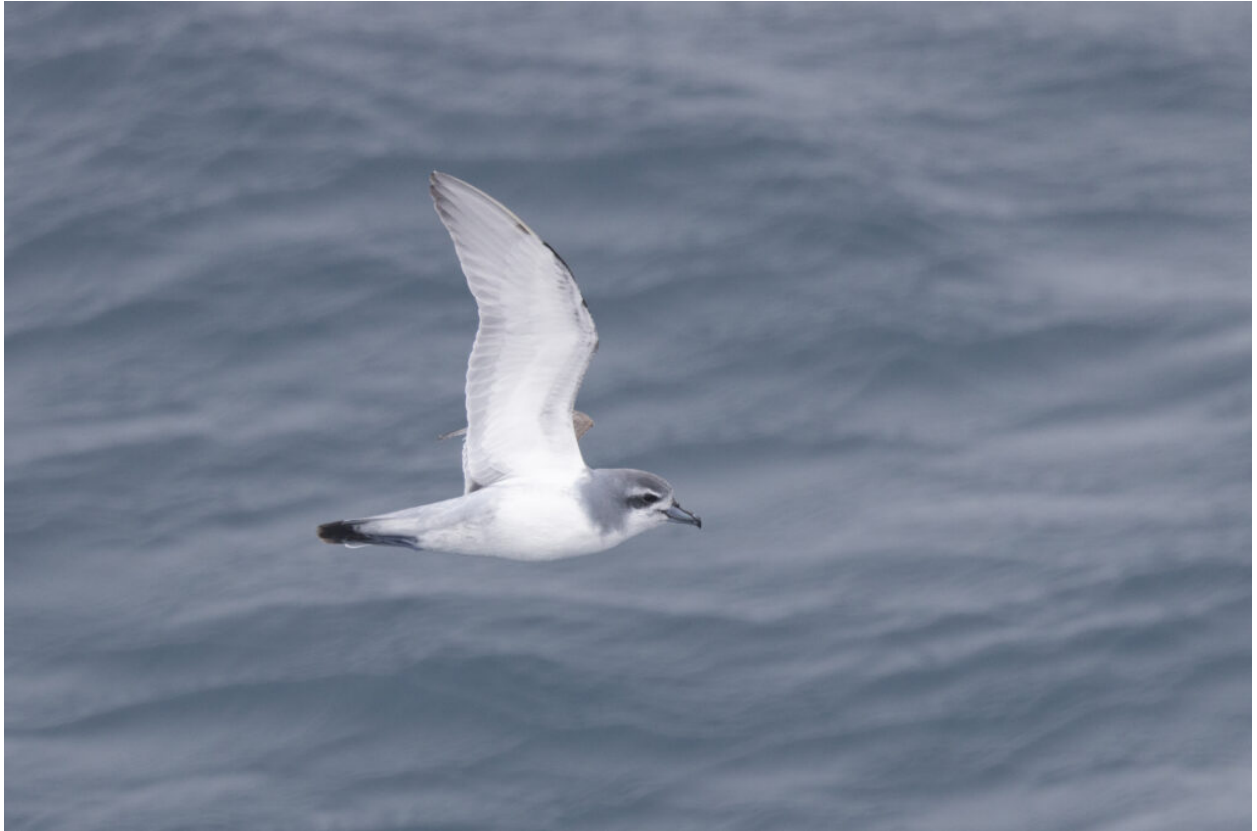
Antarctic Prion