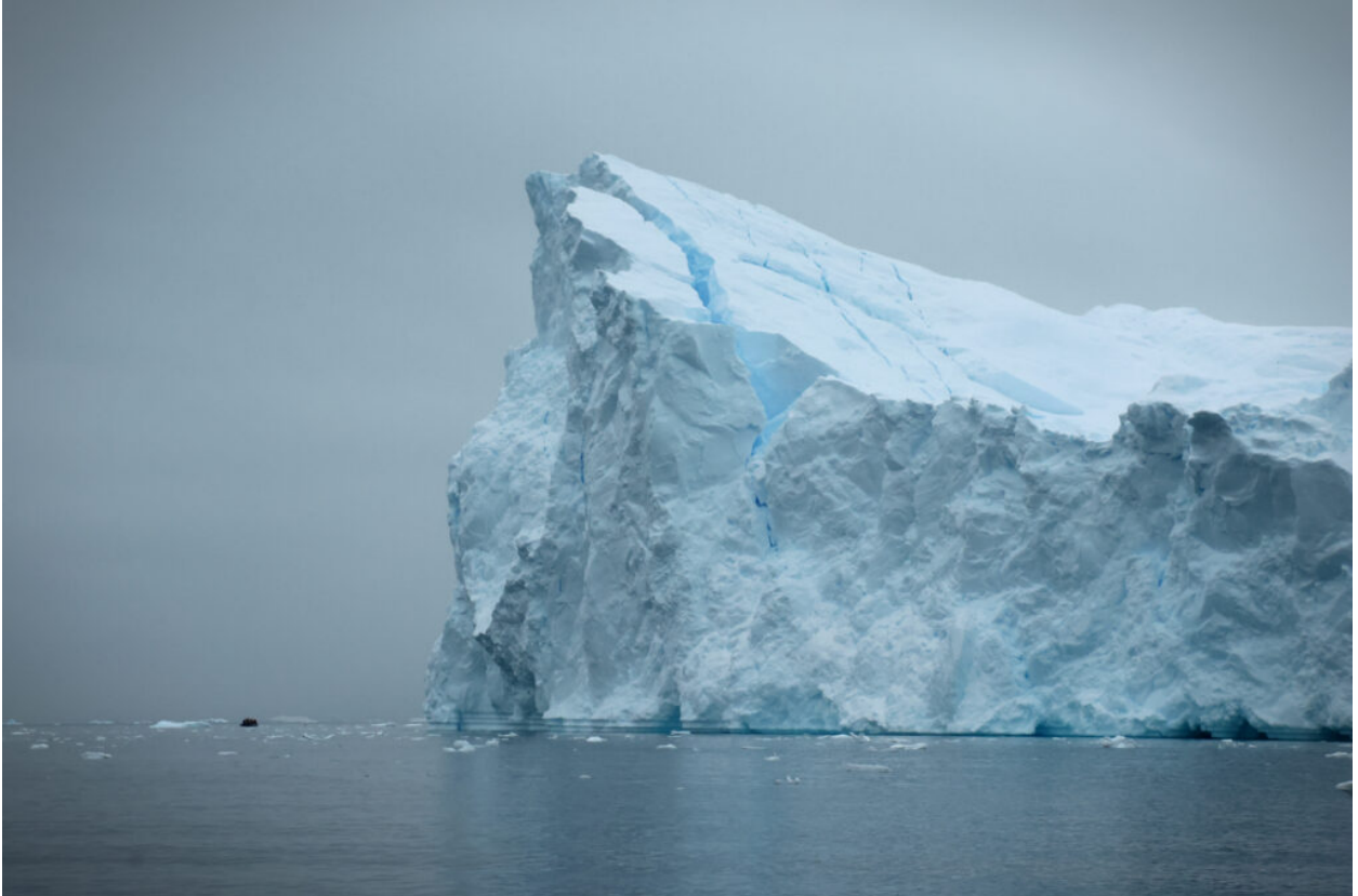
Look closely, there's a zodiac dingy there!