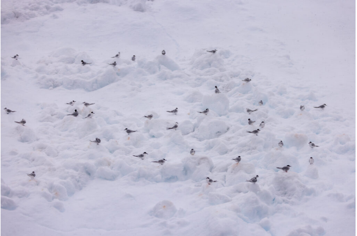
Antarctic Terns