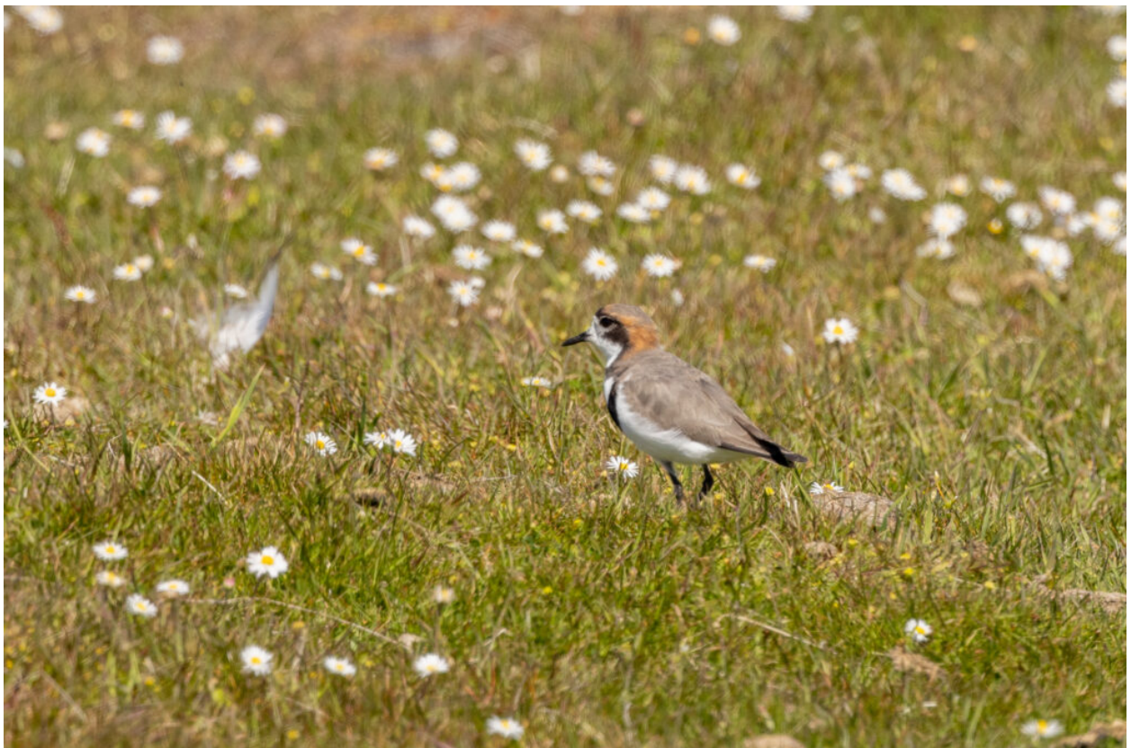
Two-banded Plover