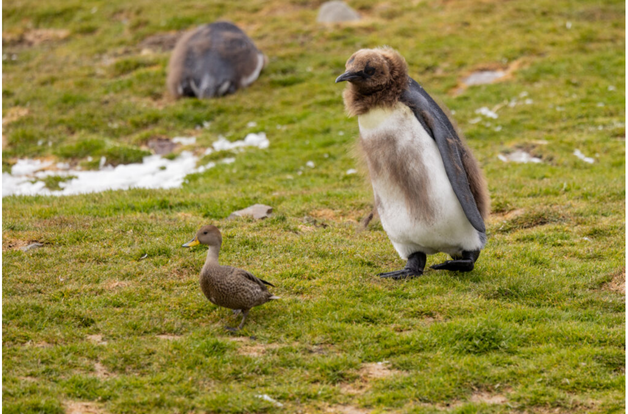
juvenile King Penguin playing South Georgia Pintail football