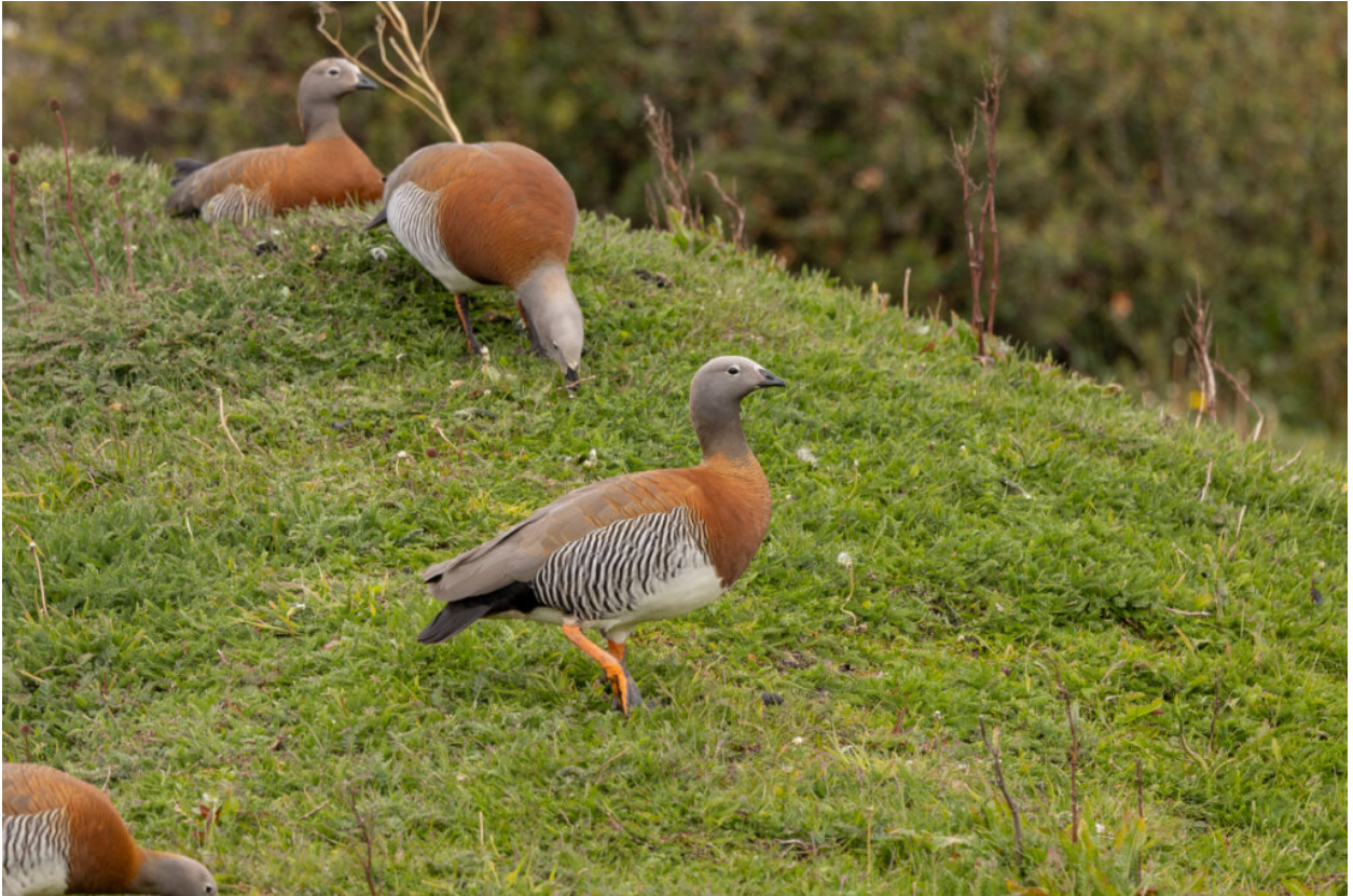
Ashy-headed Geese