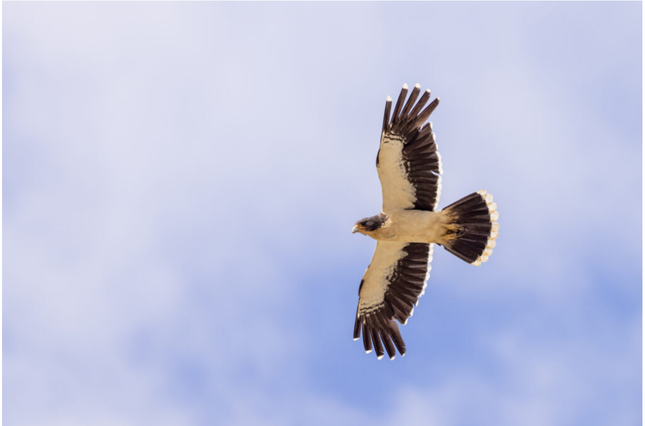
White-throated Caracara