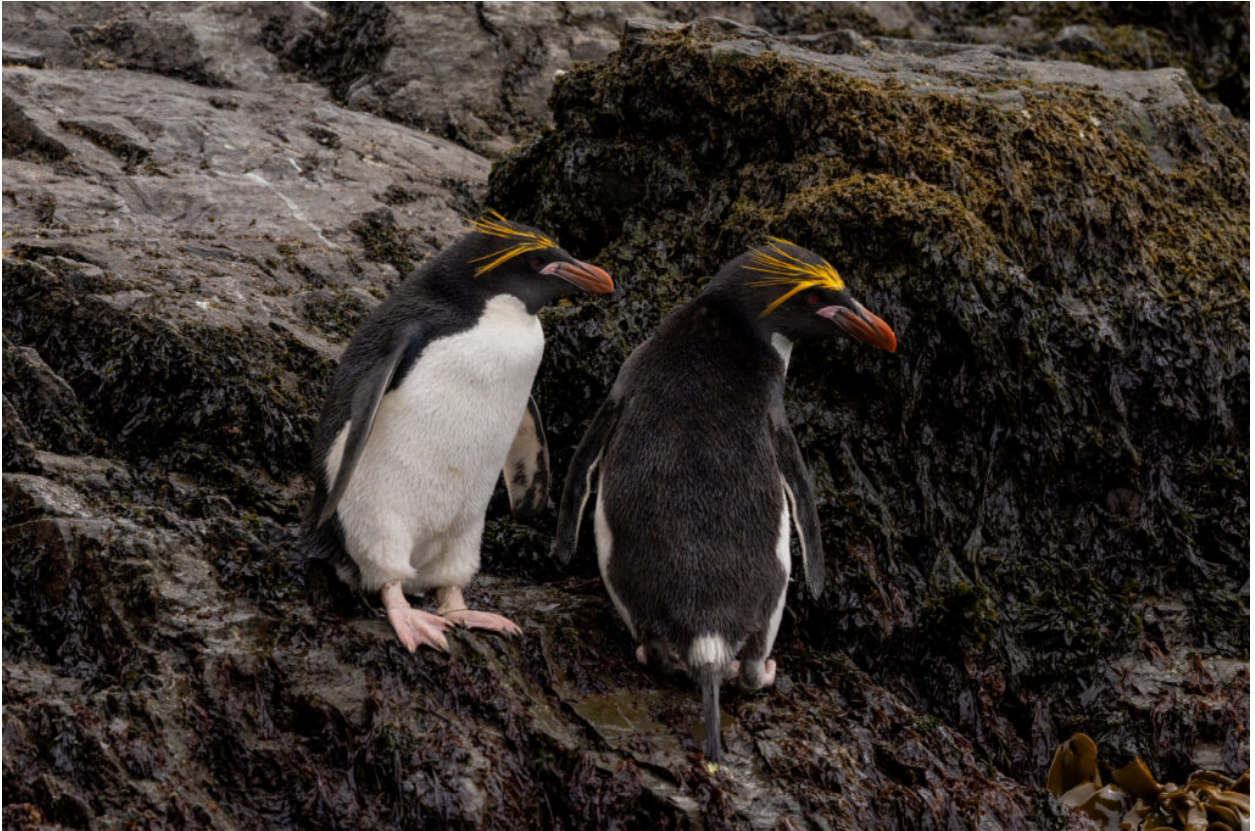
Macaroni Penguins