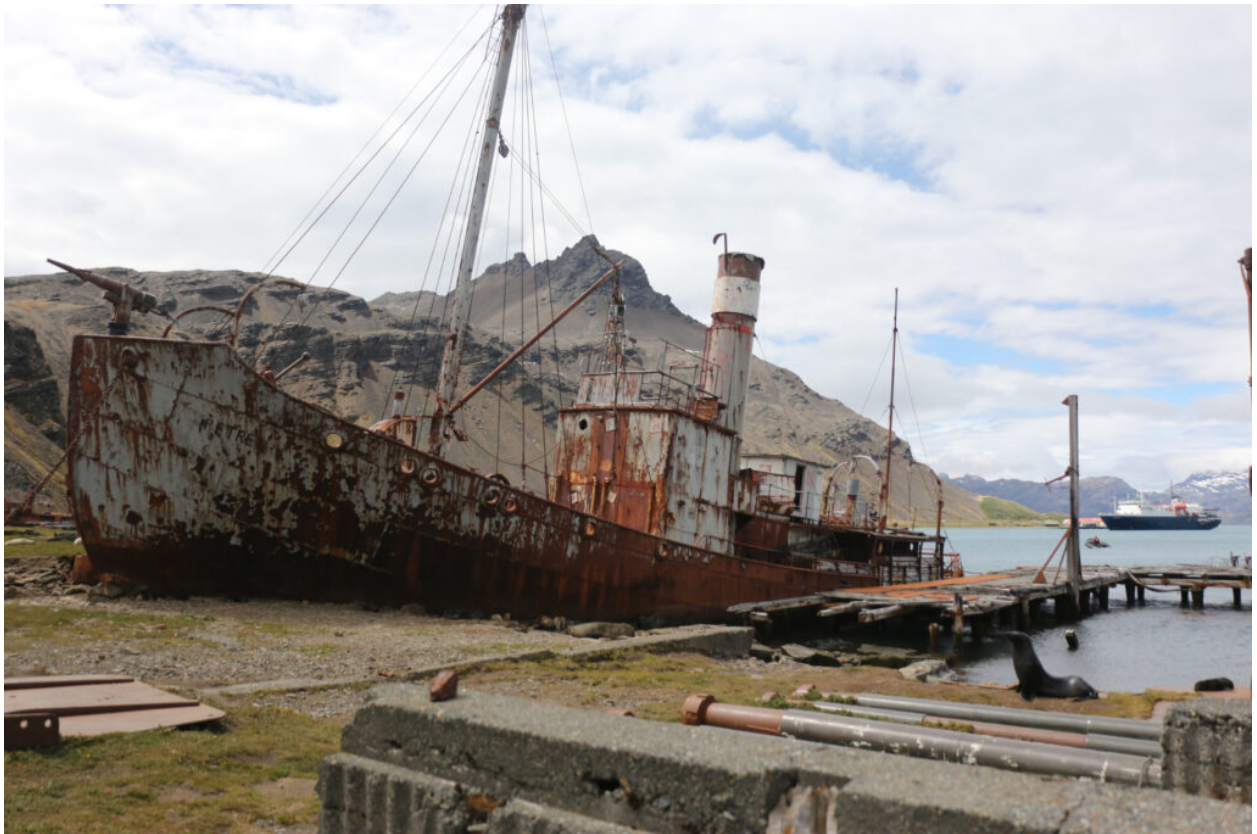
Abandoned whaling station at Grytviken