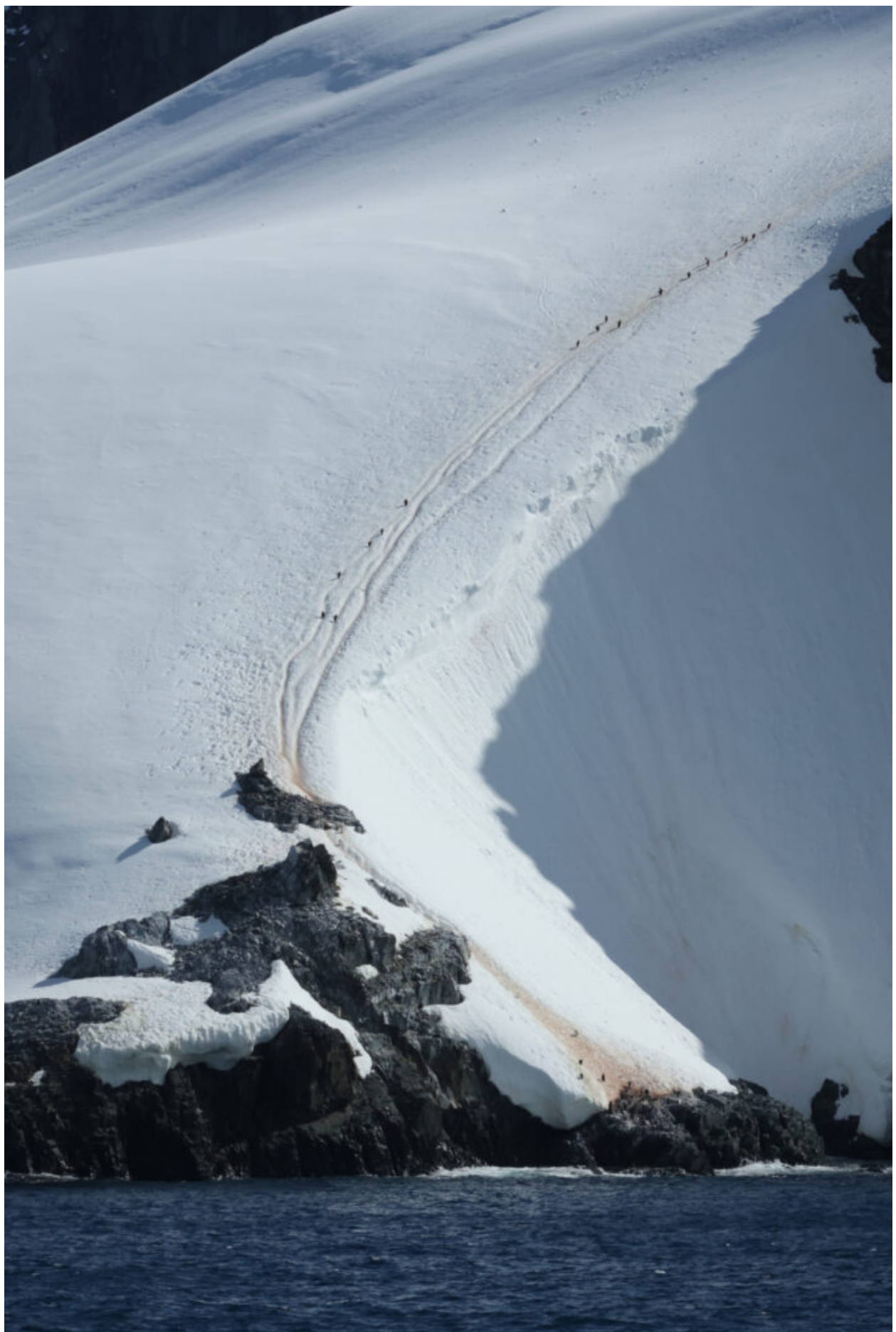
Chinstrap Penguins trailing up the mountain to their colony.