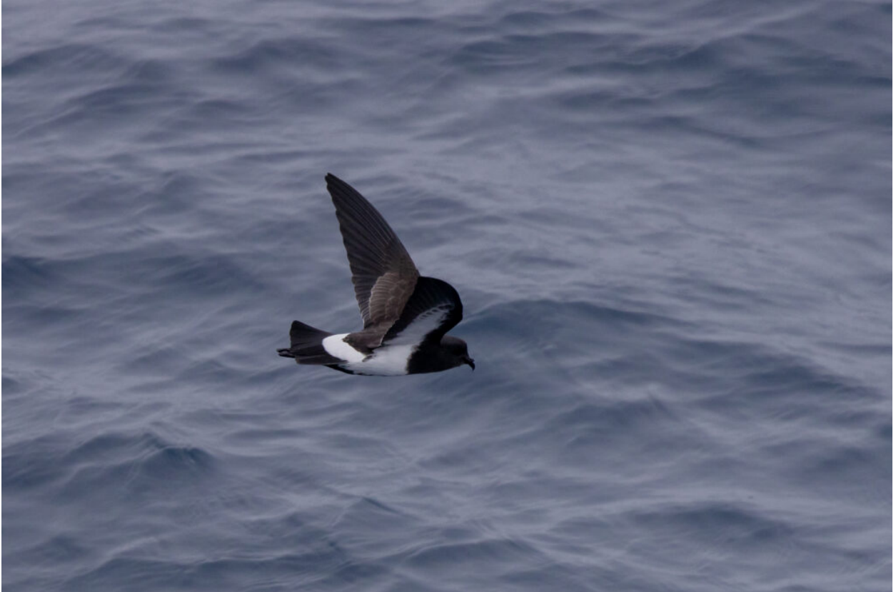
Black-bellied Storm Petrel