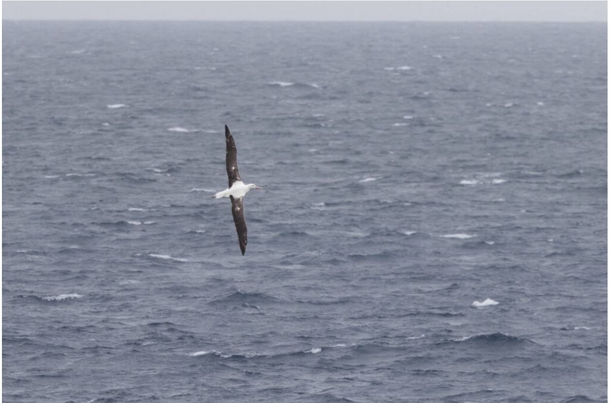
Southern Royal Albatross