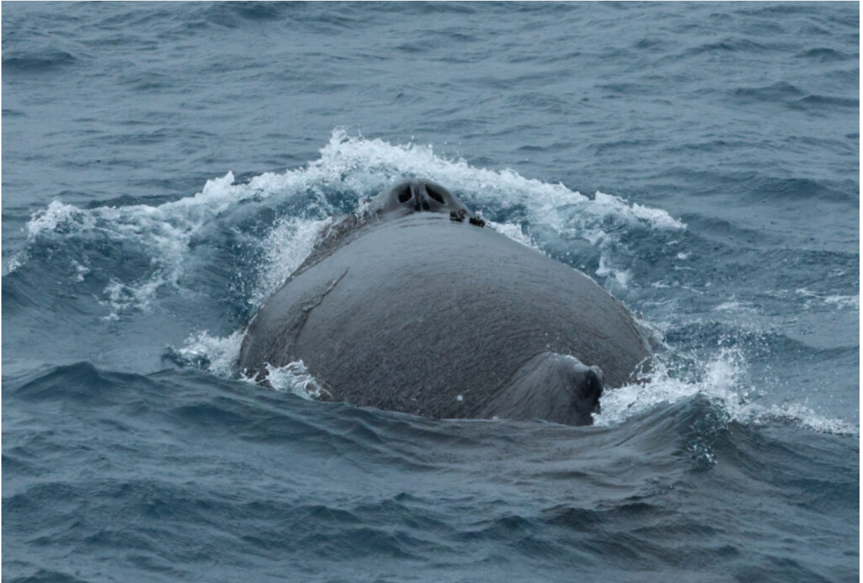
Humpback Whale