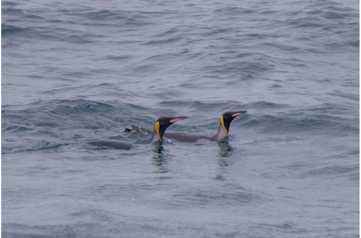
King Penguins