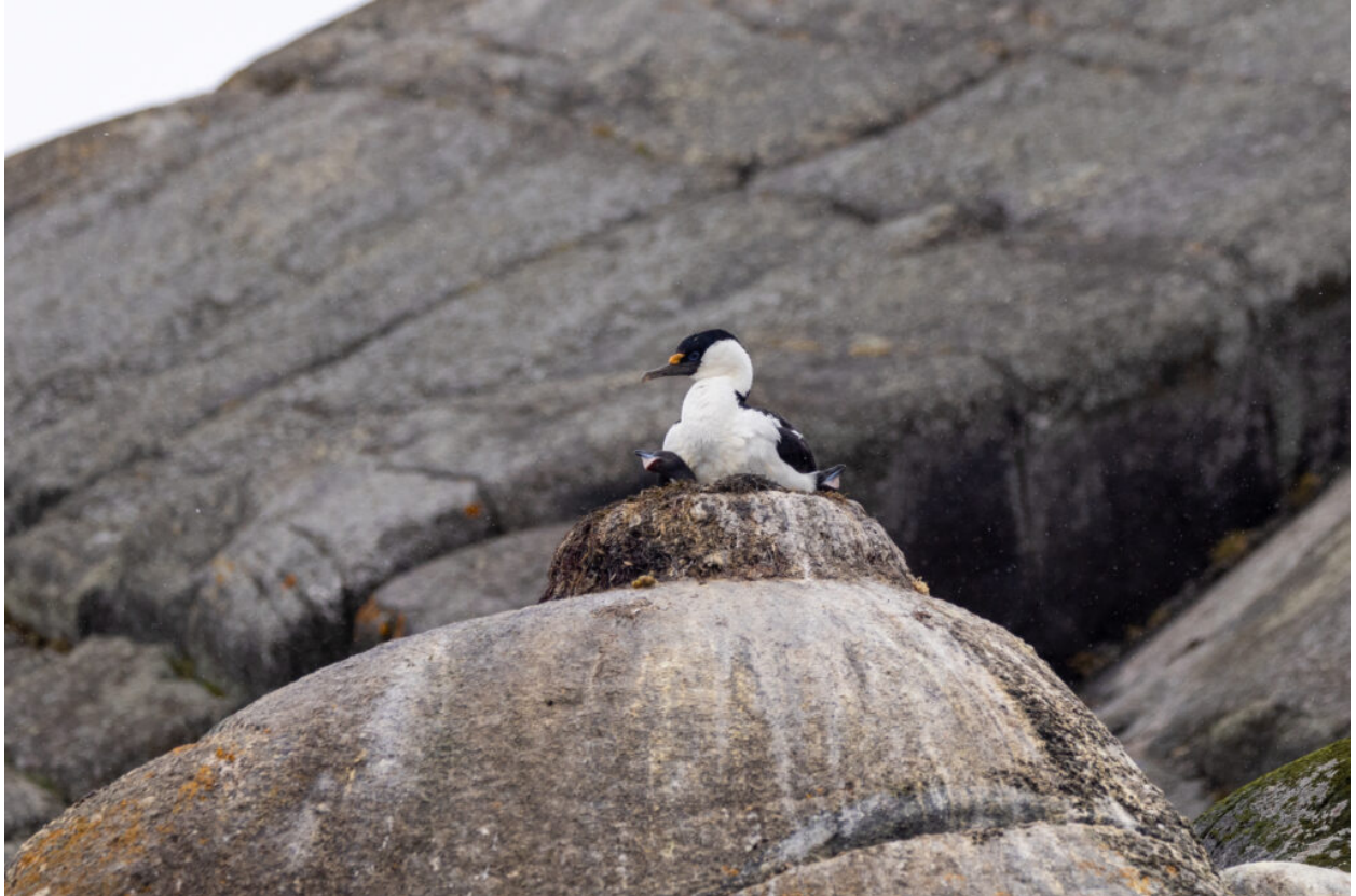
Antarctic Shag