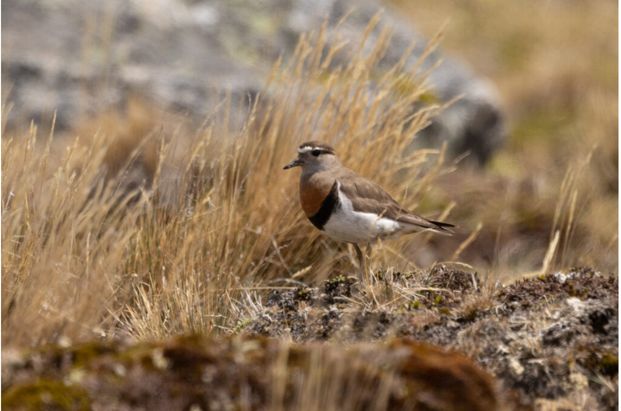
Rufous-chested Dotterel