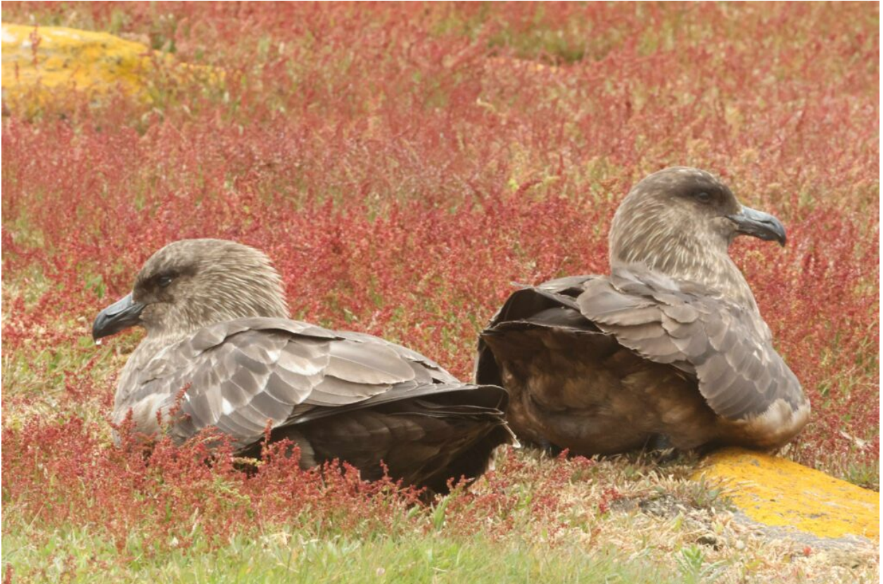
Brown Skuas