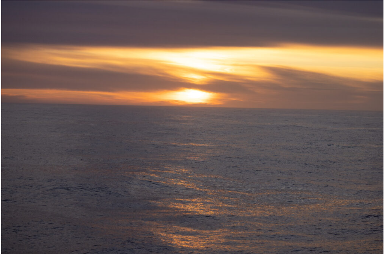
Setting sail for South Georgia!