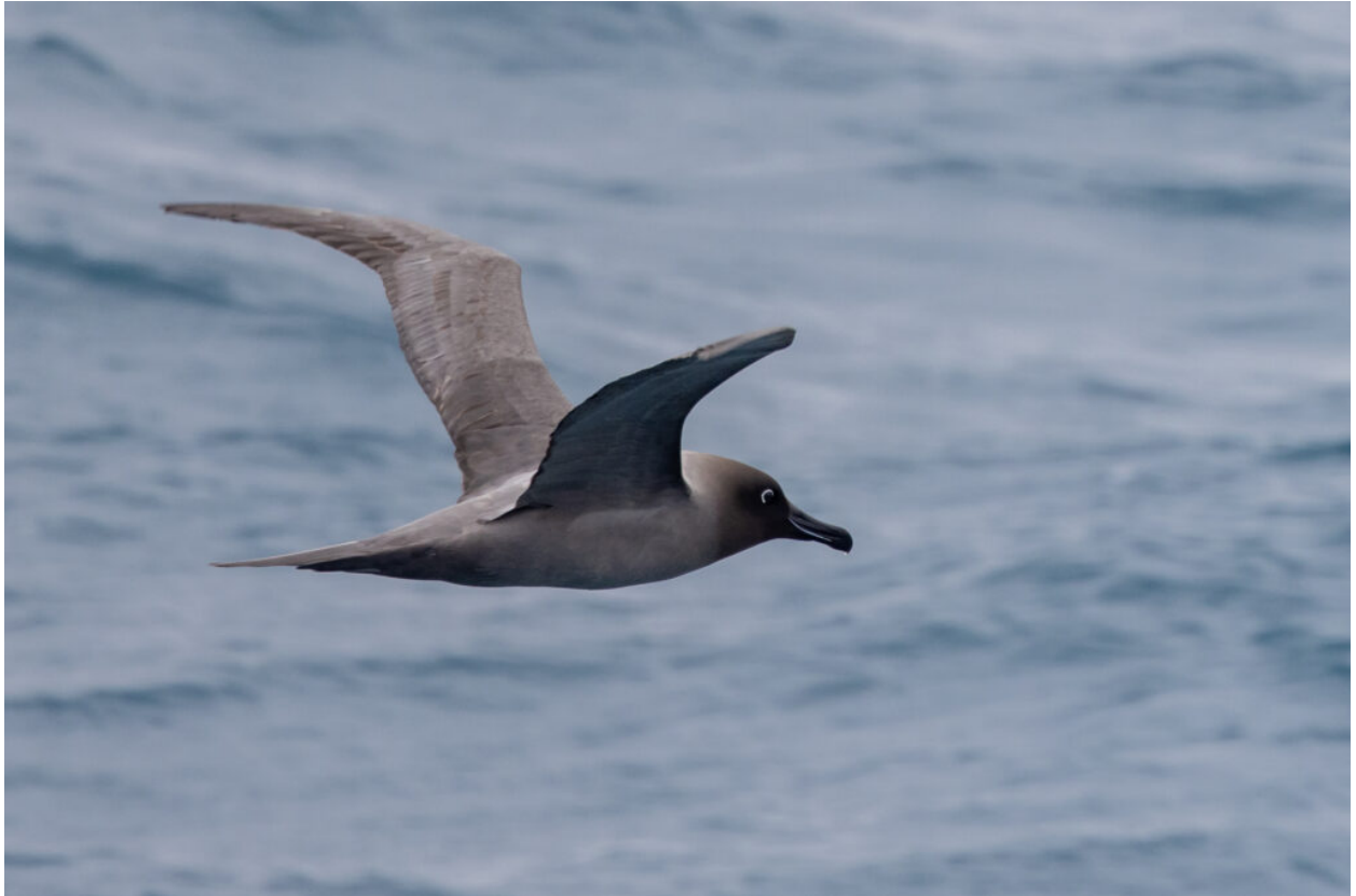
Light-mantled Albatross