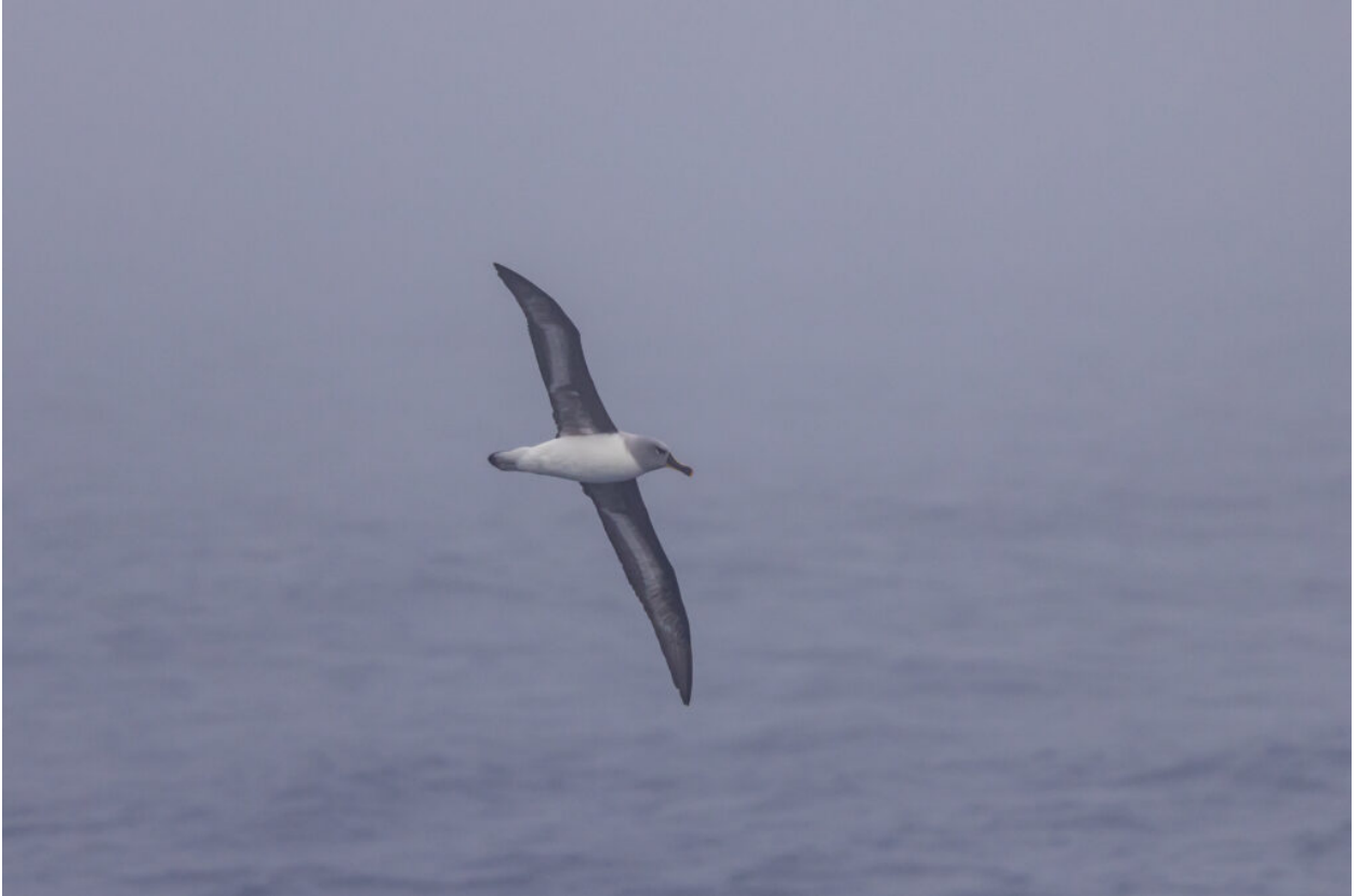
Grey-headed Albatross