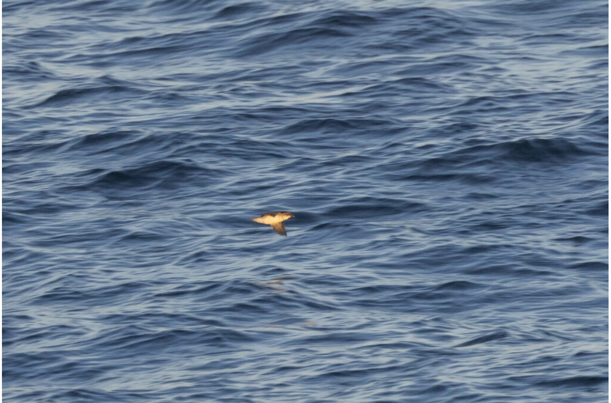
Common Diving-Petrel