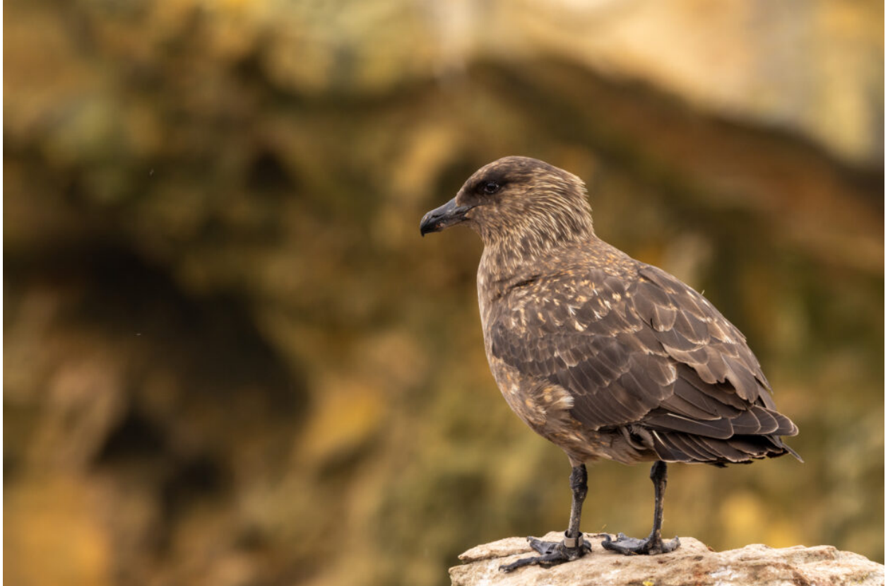
Brown Skua