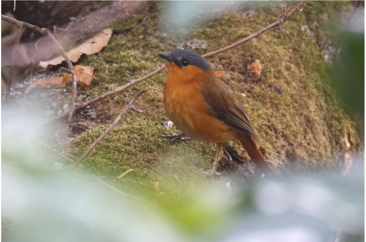
Bocage's Akalat