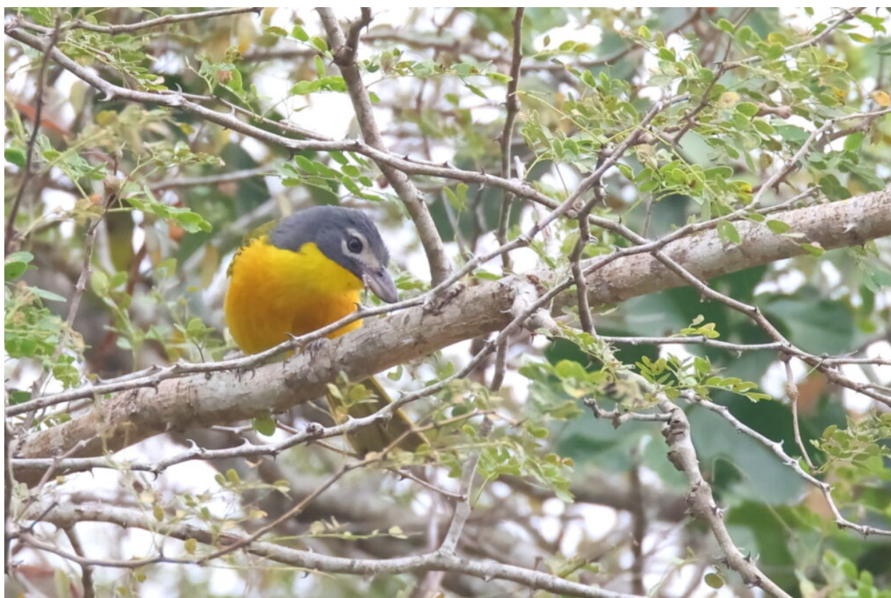
Monteiro's Bushshrike