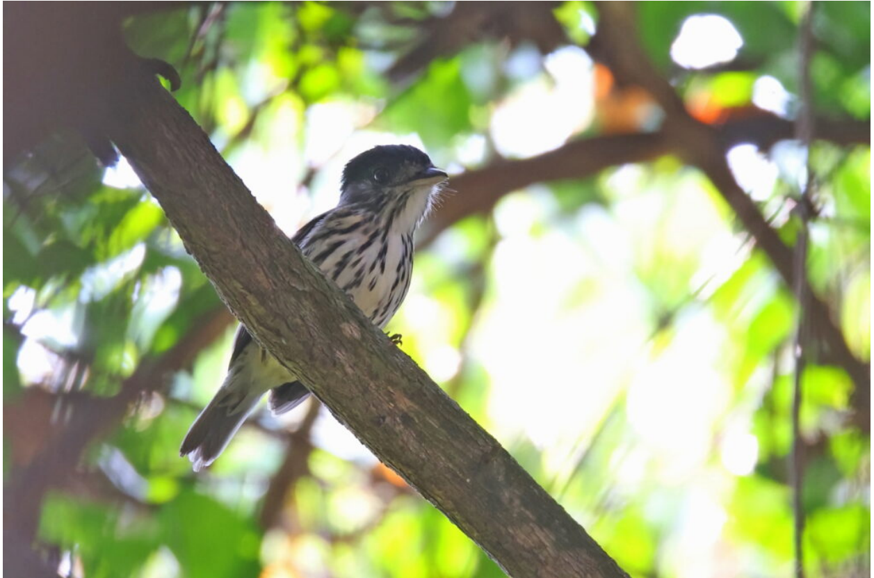
African Broadbill