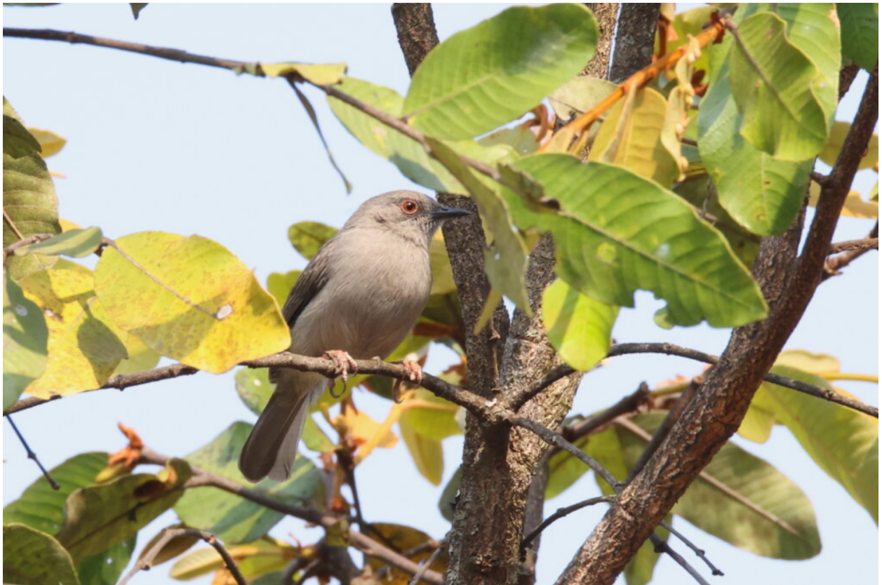
Miombo Wren Warbler