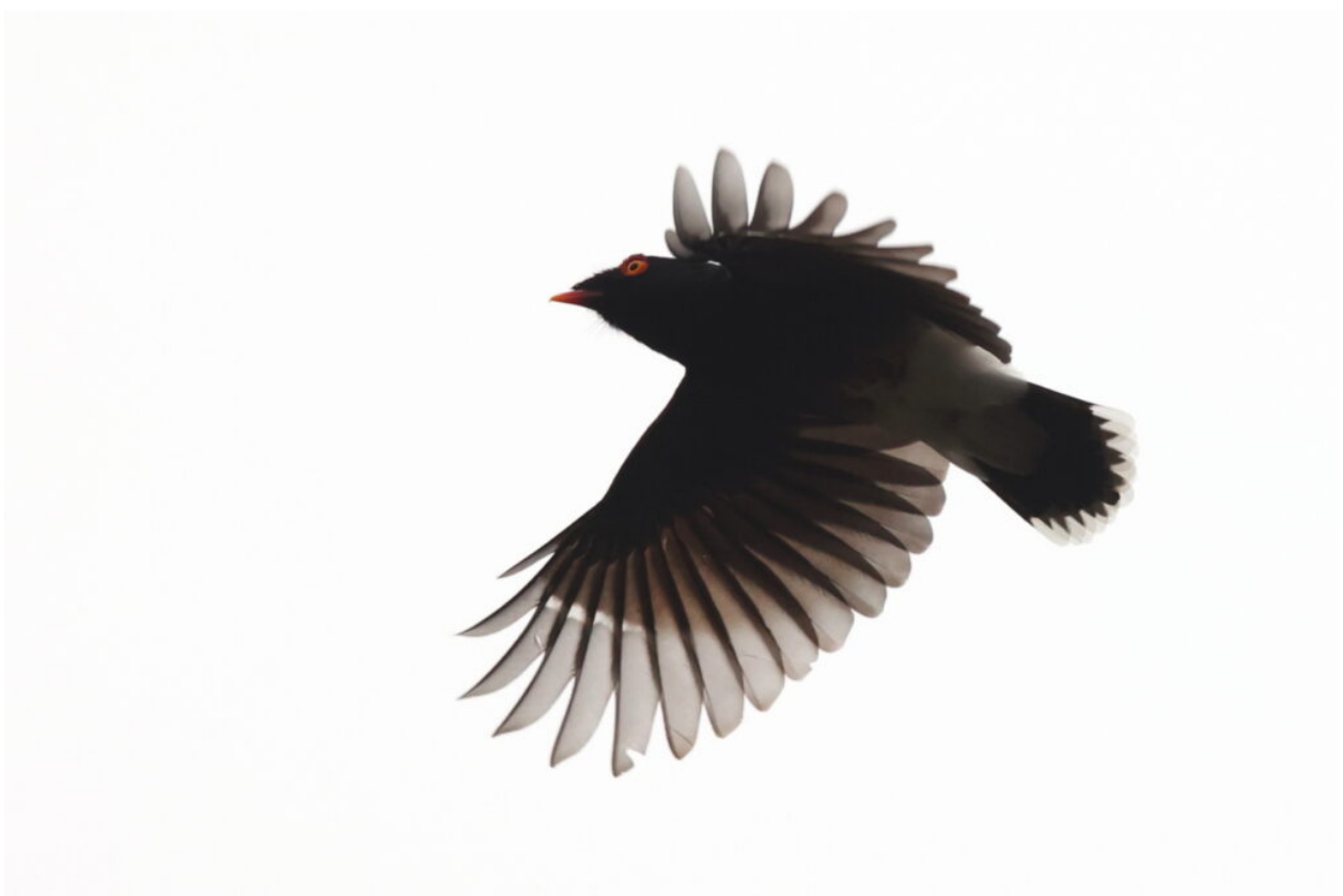
Gabela Helmetshrike