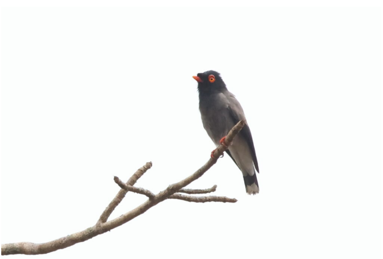
Gabela Helmet Shrike