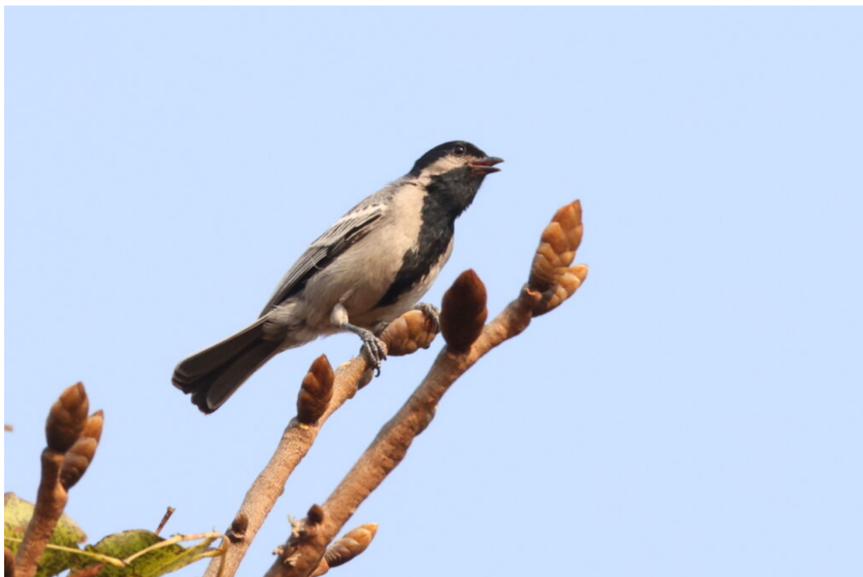
Miombo Tit