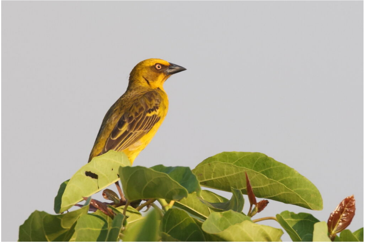
Bocage's Weaver