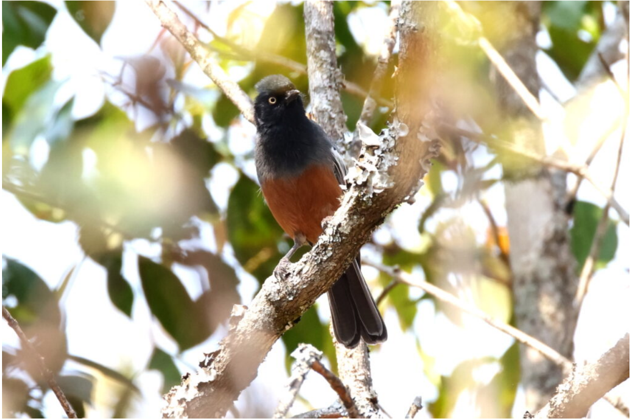
Rufous-bellied Tit