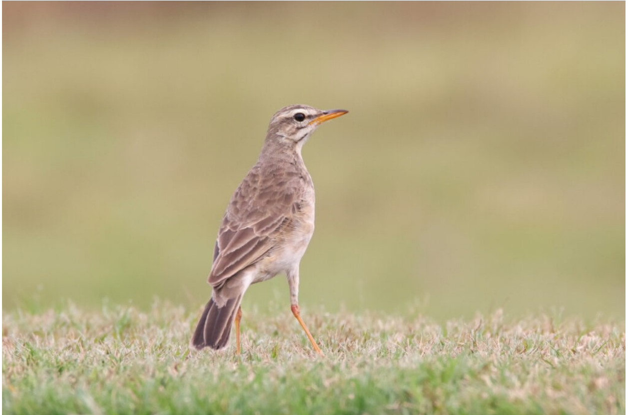
Long-legged Pipit