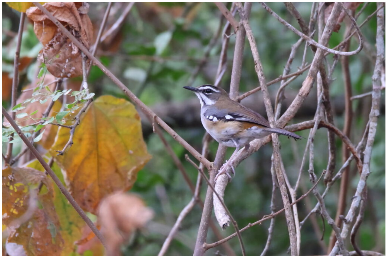
Forest Scrub Robin