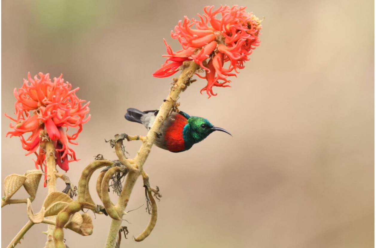
Olive-bellied Sunbird