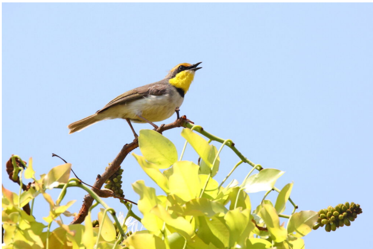
Black-necked Eremomela