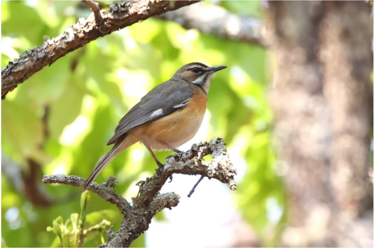
Miombo Scrub Robin