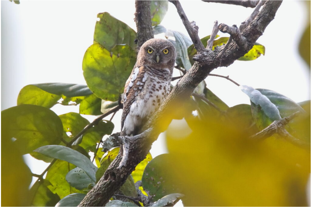
African Barred Owlet