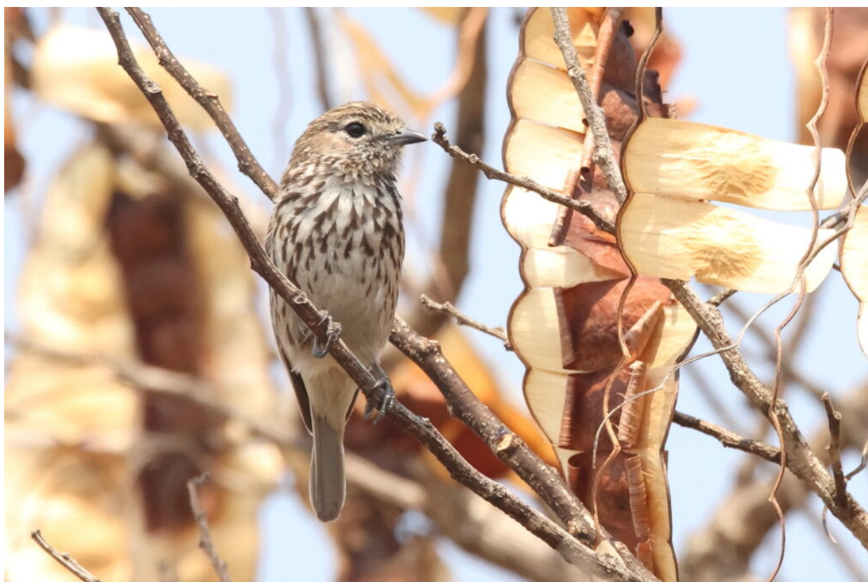
Böhm's Flycatcher