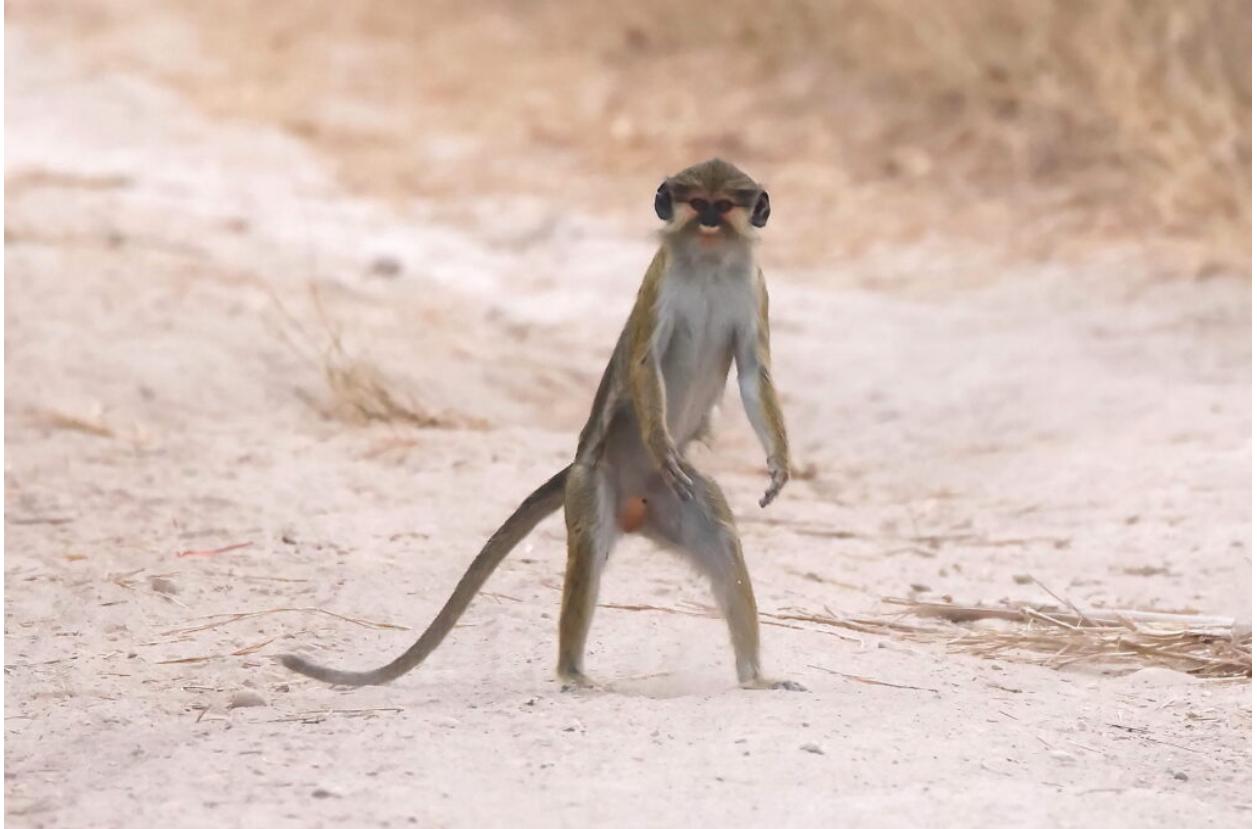
Southern Talapoin Monkey