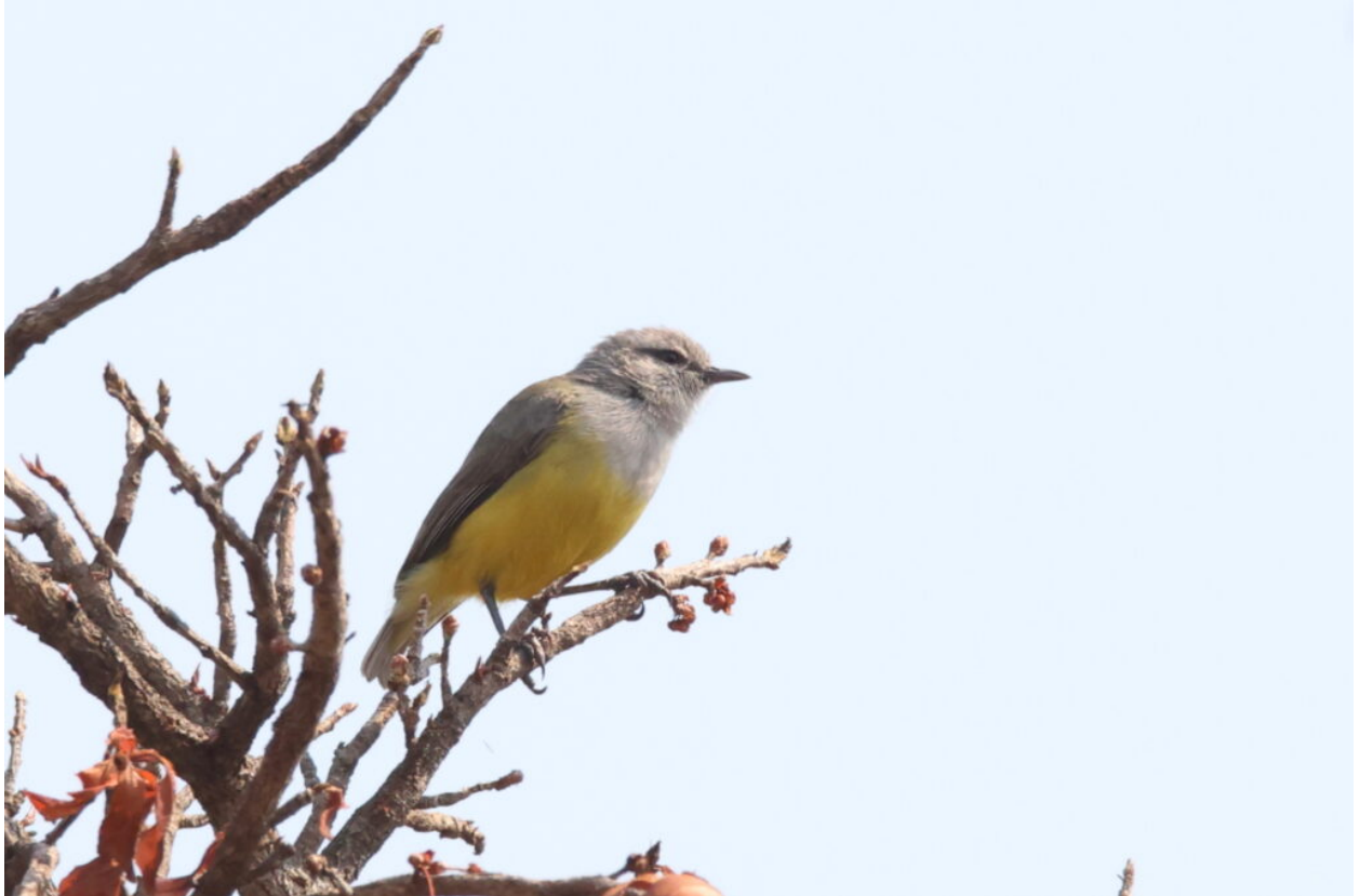
Salvadori's Yellow-bellied Eremomela