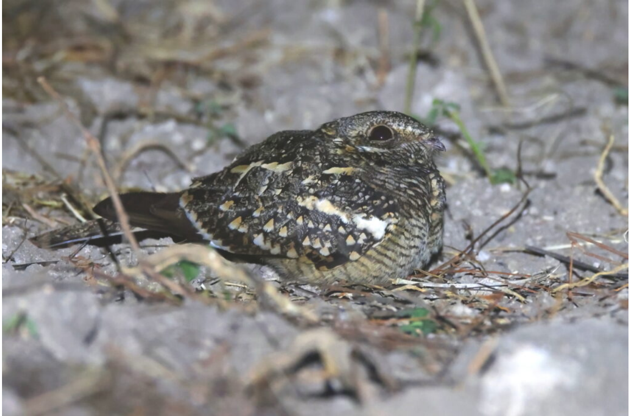
Square-tailed Nightjar