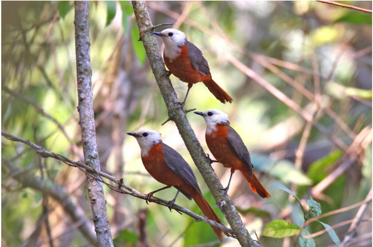
White-headed Robin Chats

Gambian Sun Squirrel Heliosciurus gambianus