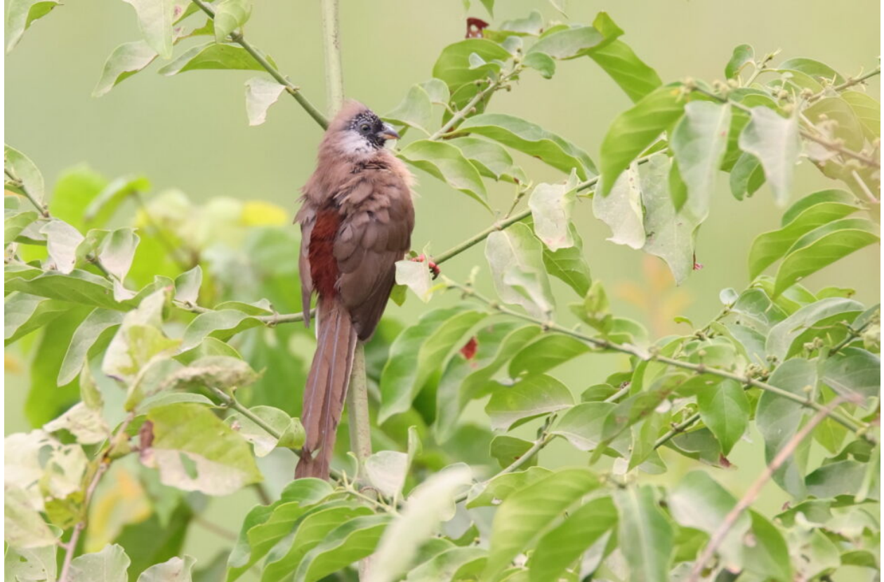
Red-backed Mousebird