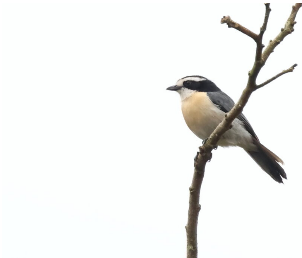
Grey-green Bushshrike