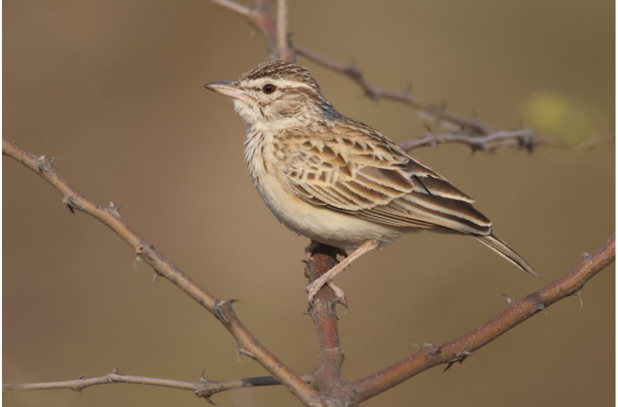
Sabota Lark