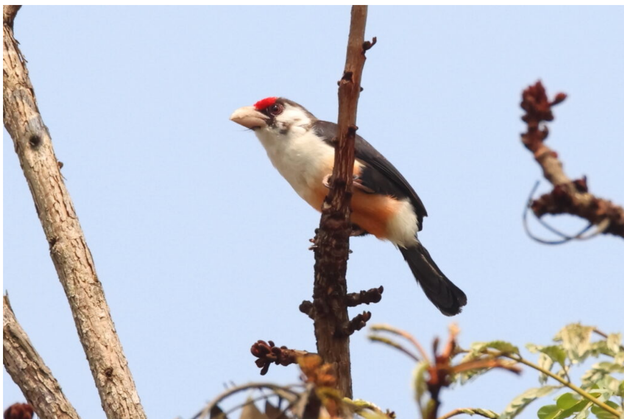
Black-backed Barbet