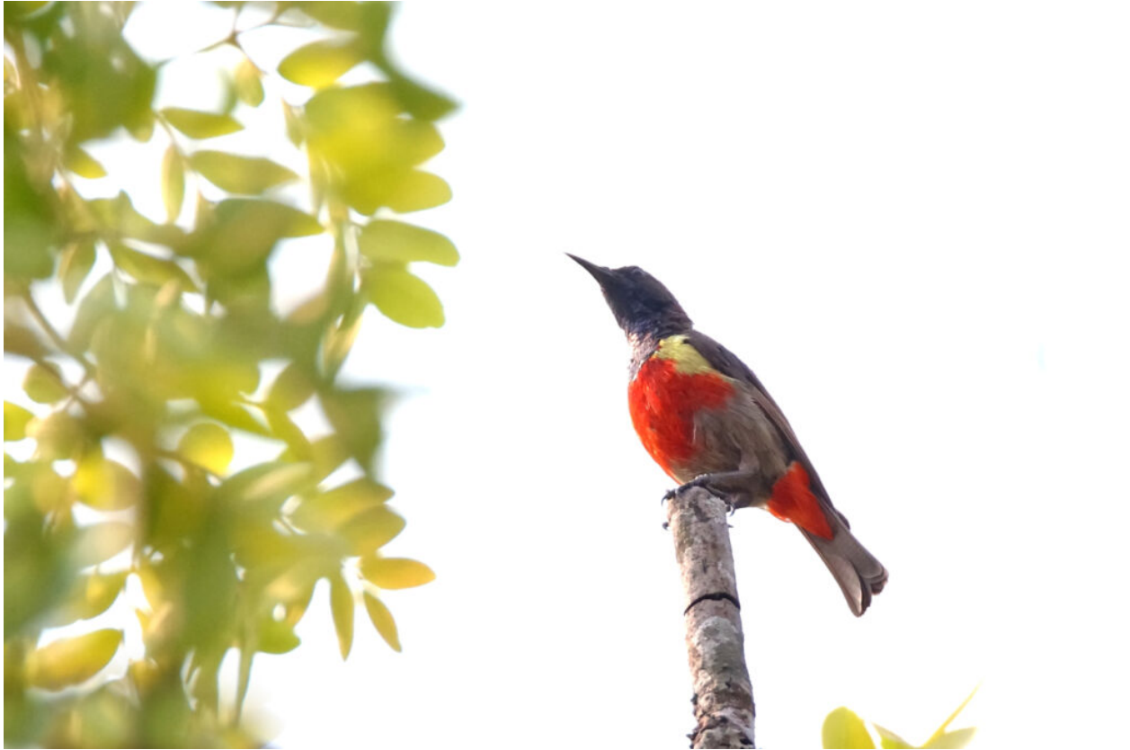
Anchieta's Sunbird