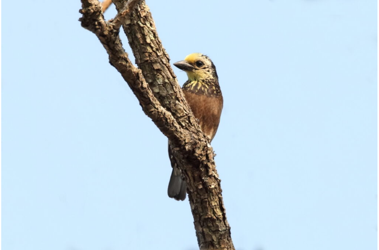
Anchieta's Barbet