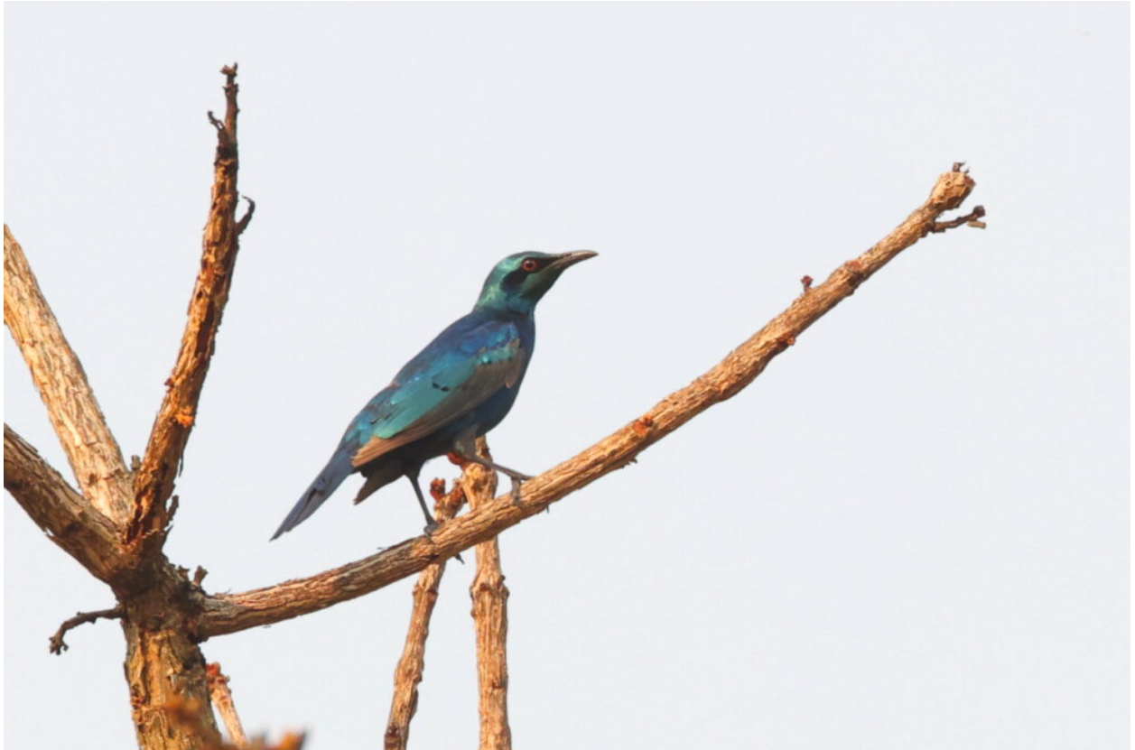
Sharp-tailed Starling