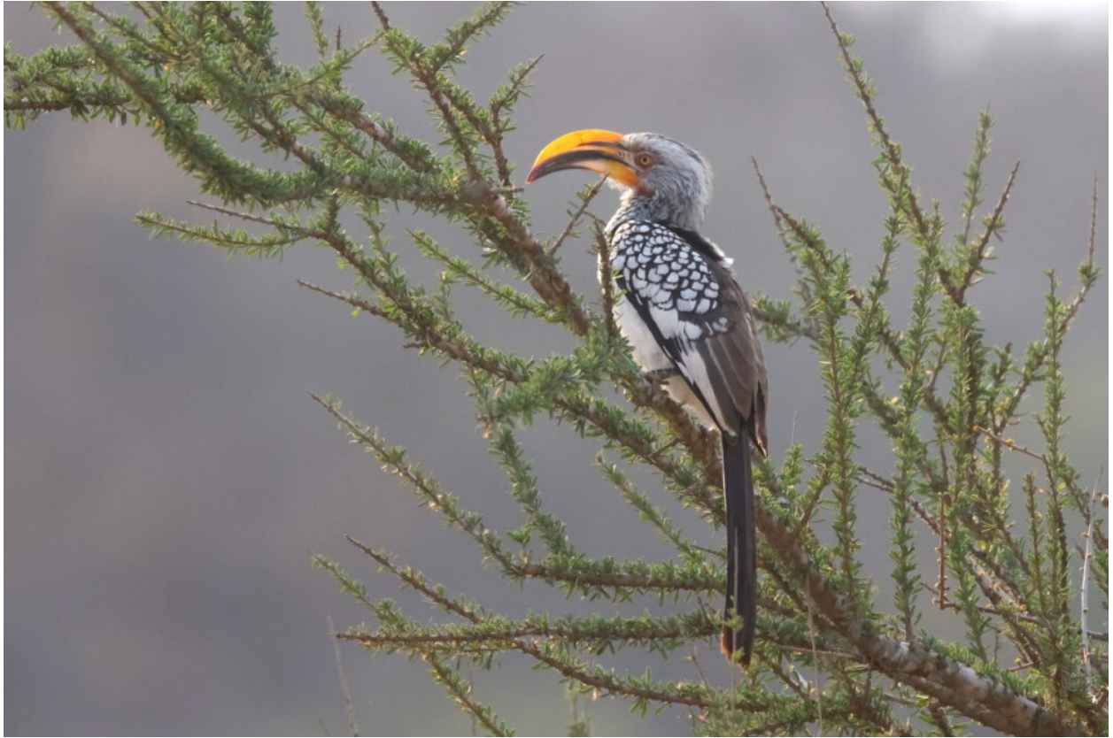
Southern Yellow-billed Hornbill