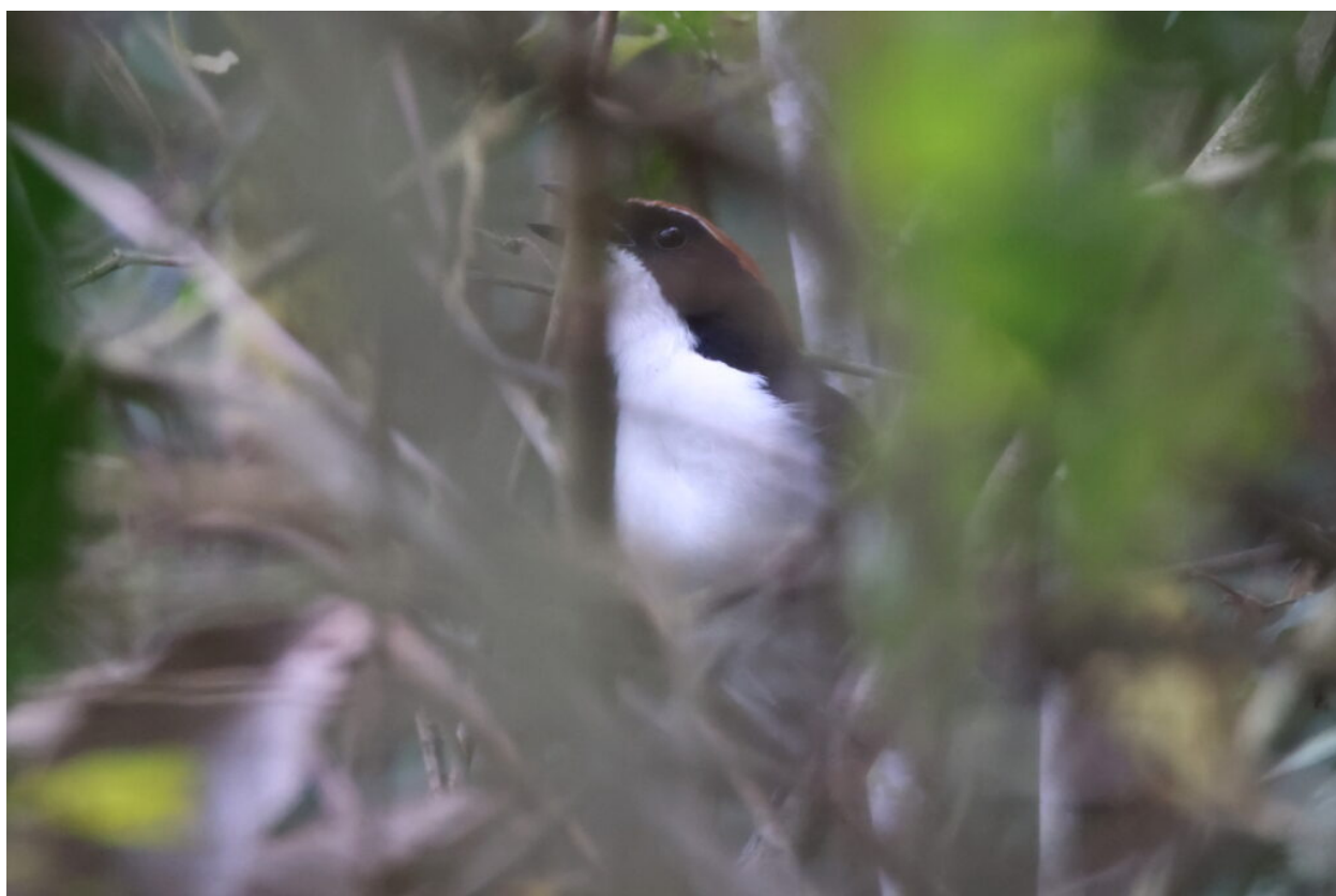
Gabela Bushshrike