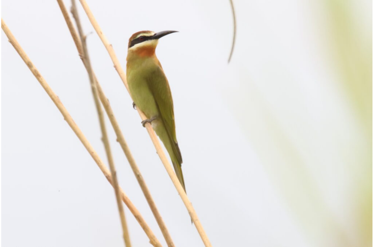
Olive Bee-eater