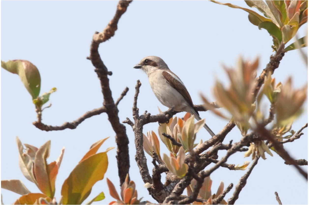
Souza's Shrike