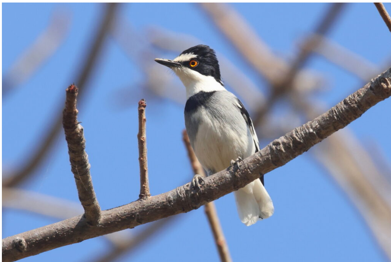
White-tailed Shrike