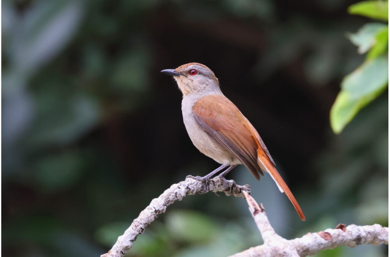
Rufous-tailed Palm Thrush