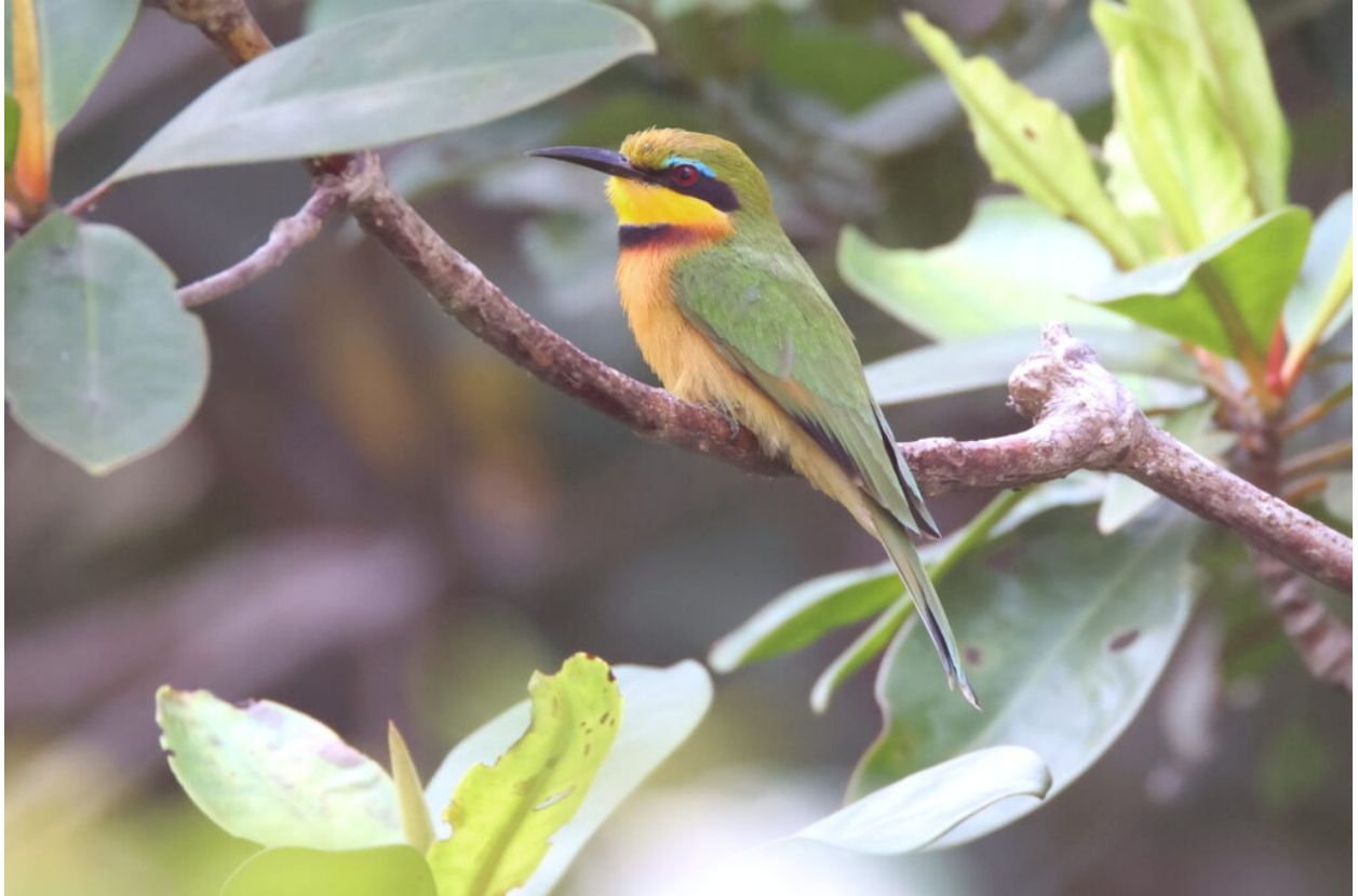
Little Bee-eater