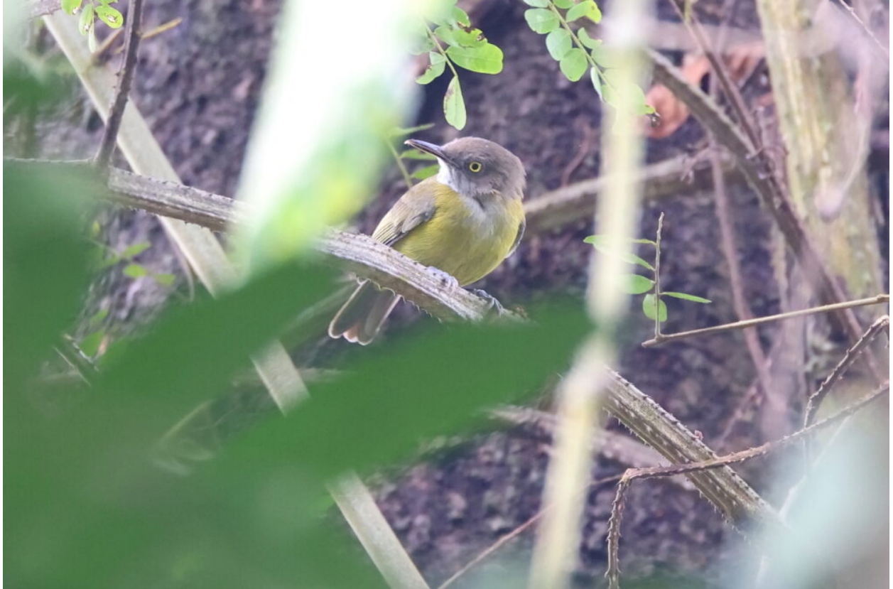
Yellow Longbill (image by Janos Olah)