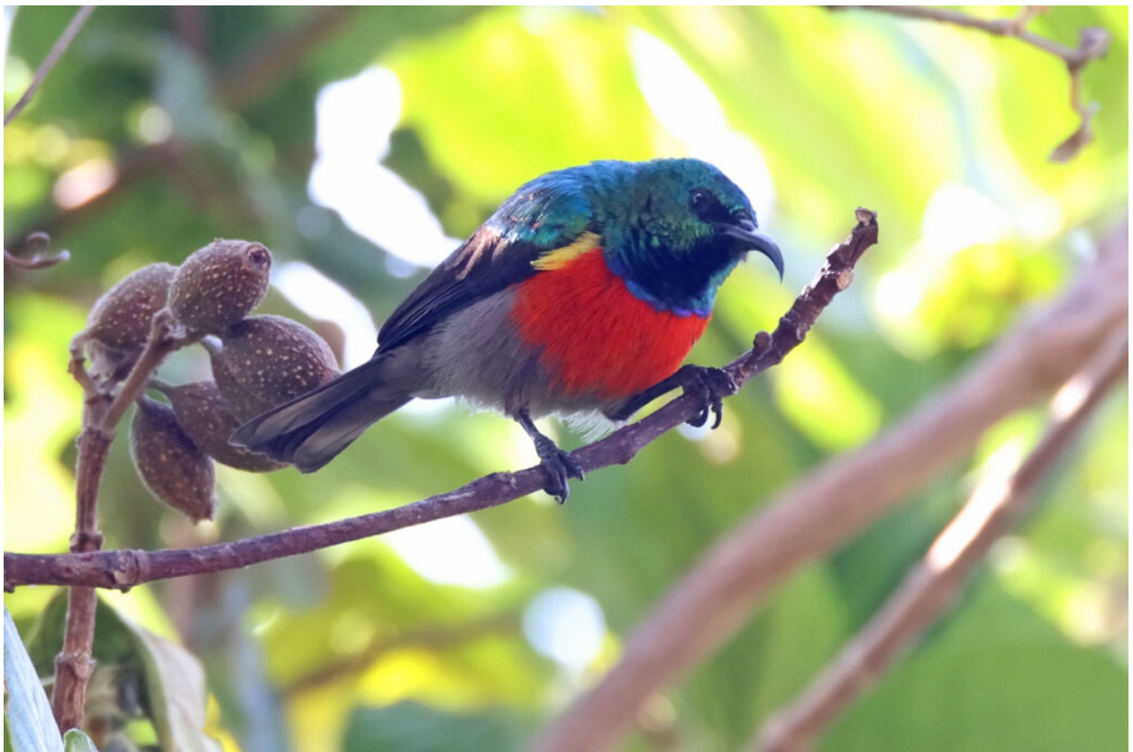
Ludwig's Double-collared Sunbird