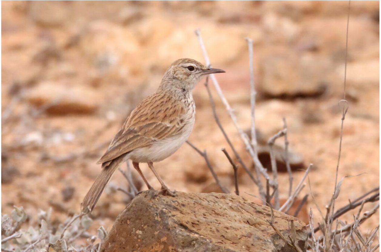
Karoo-Benguela Long-billed Lark