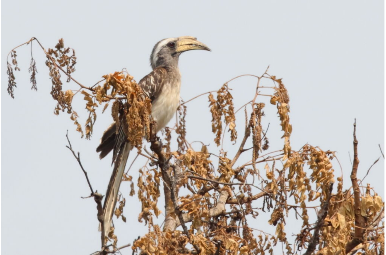
Pale-billed Hornbill