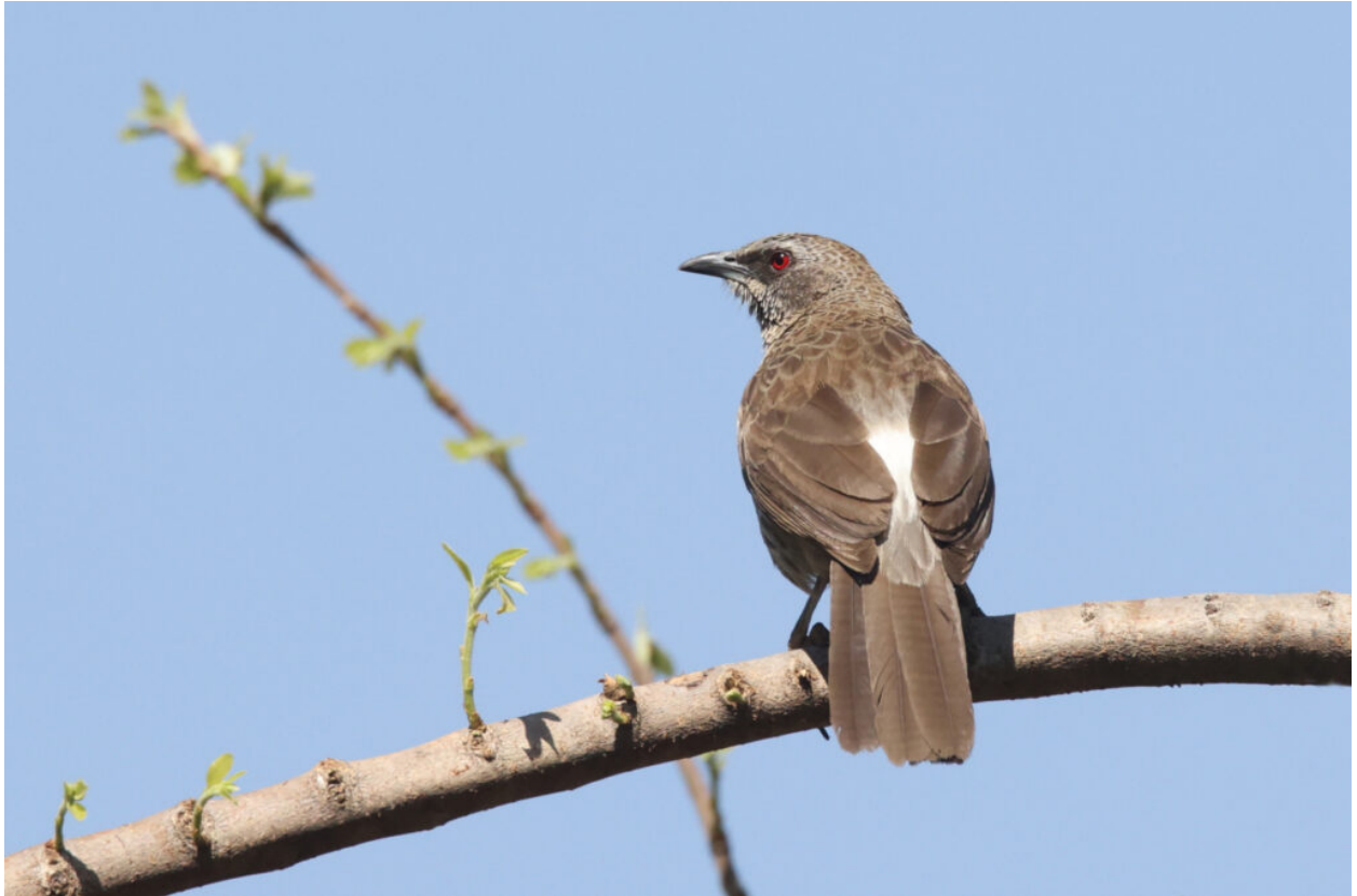
Hartlaub's Babbler