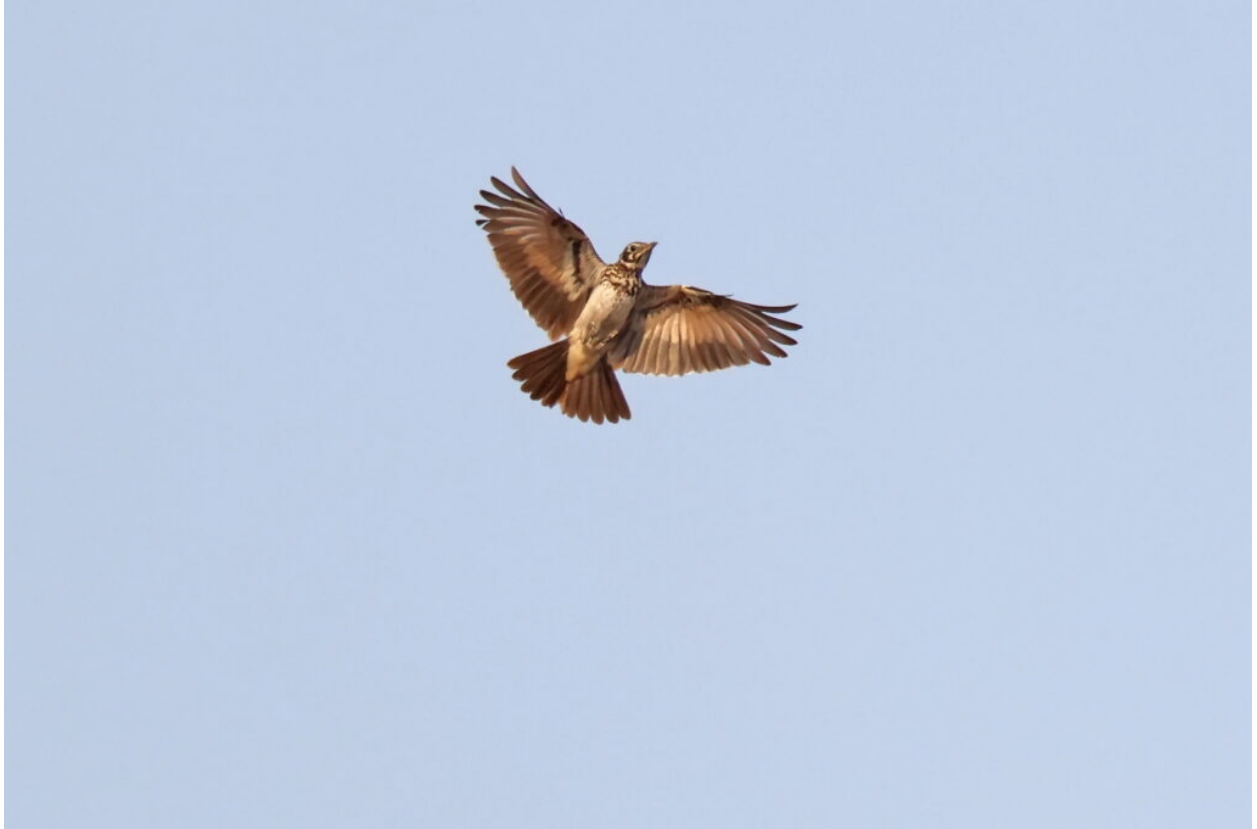
Dusky Lark (image by Janos Olah)