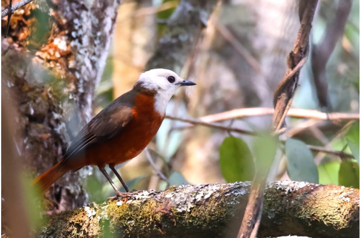
White-headed Robin Chat