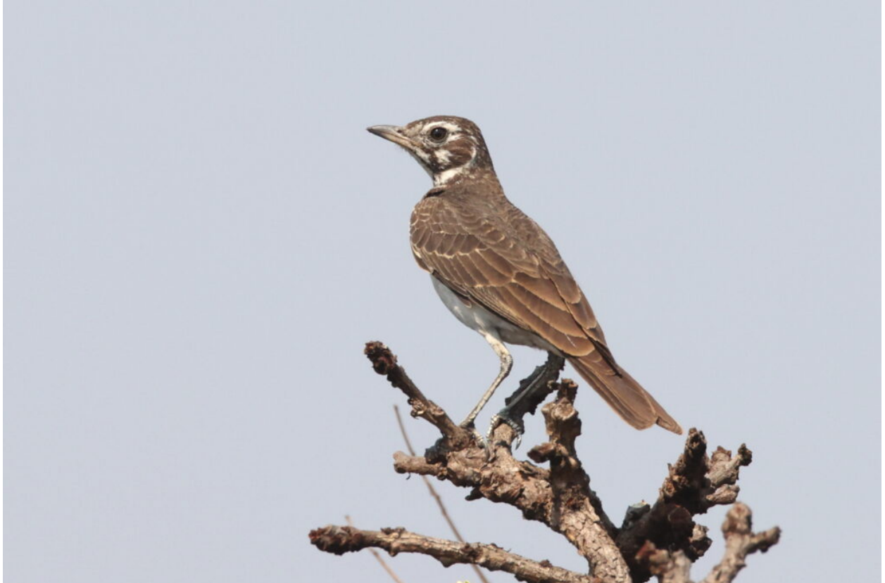
Dusky Lark