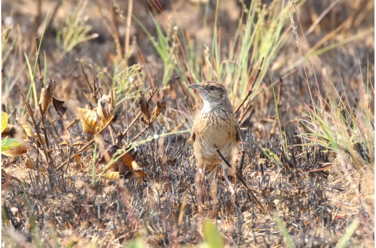
Angola Lark