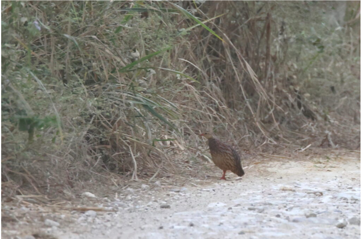
Grey-striped Francolin