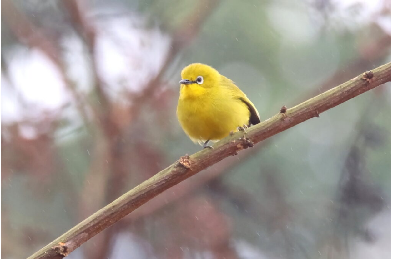
Angolan White-eye