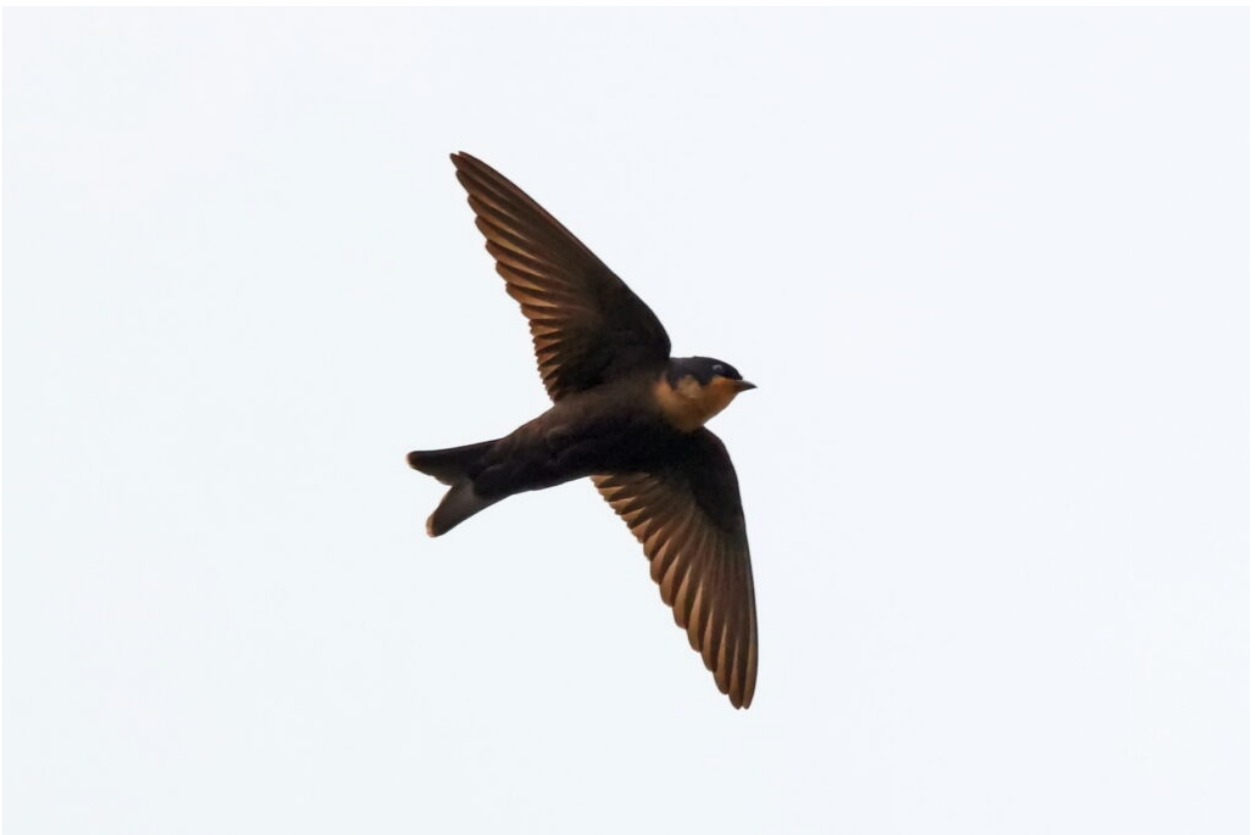
New wood swallow species