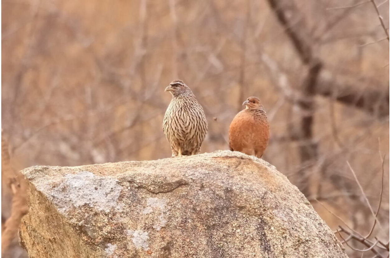
Hartalub's Francolins