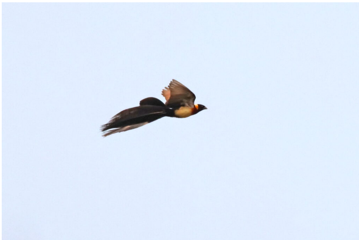
Broad-tailed Paradise Whydah (image by Janos Olah)