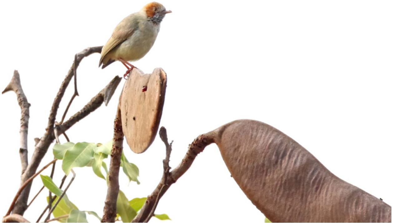
Red-capped Eremomela