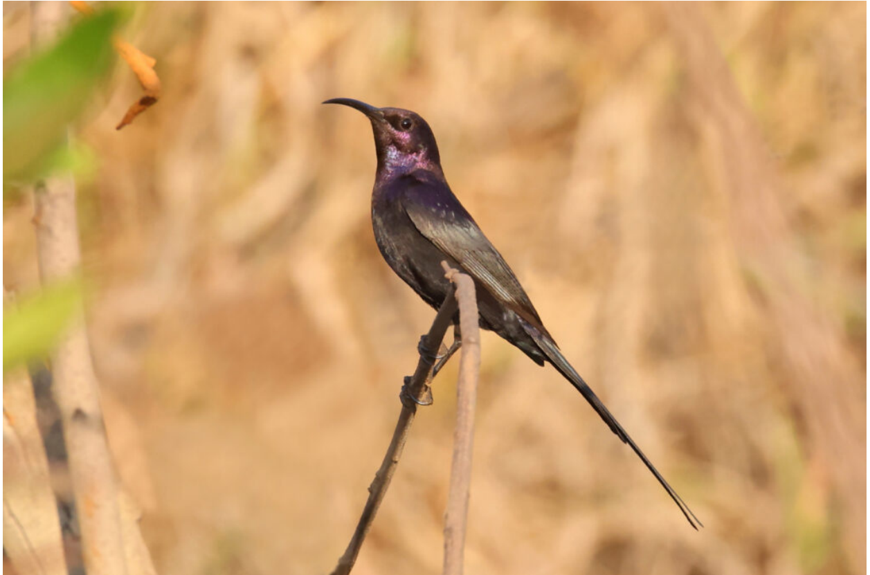
Bocage's Sunbird