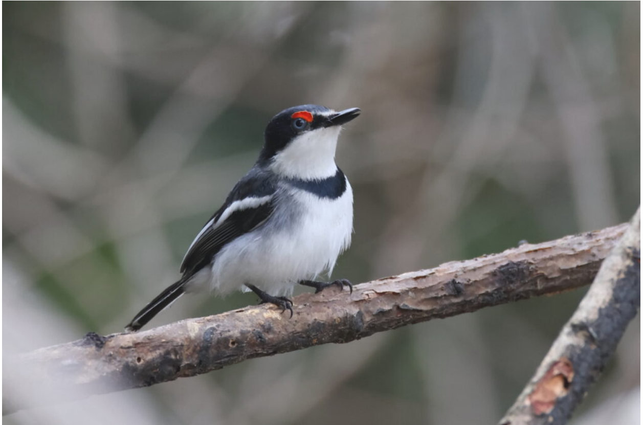
White-fronted Wattle-eye