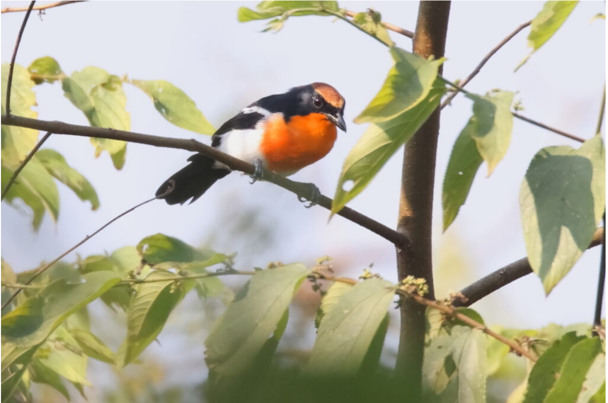
Braun's Bushshrike