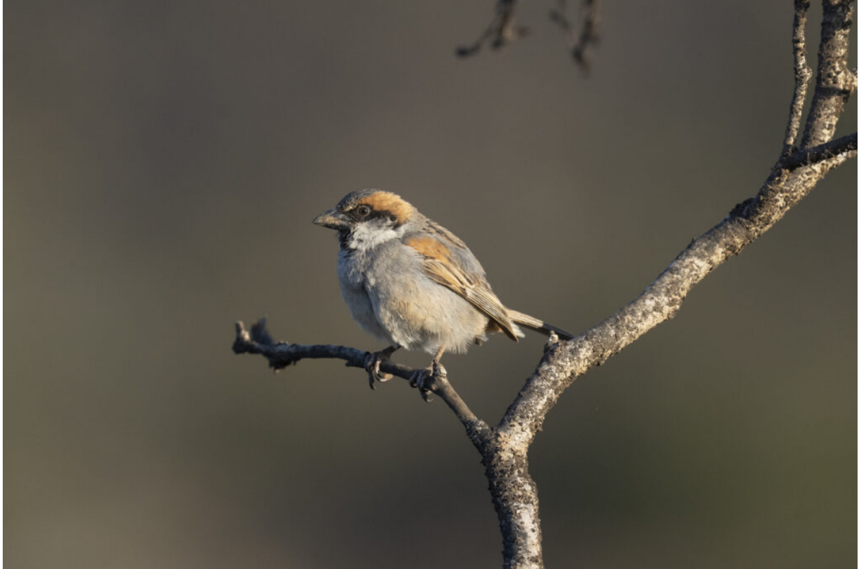
Socotra Sparrow