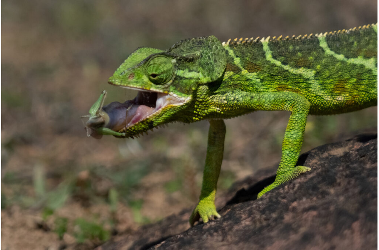
A Socotra Chameleon enjoying his grasshopper breakfast