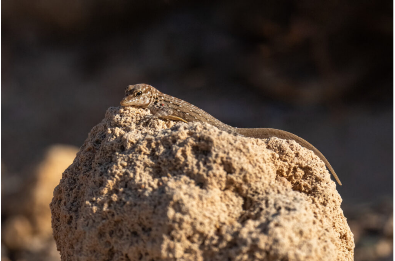
Abd al Kuri Rock Gecko