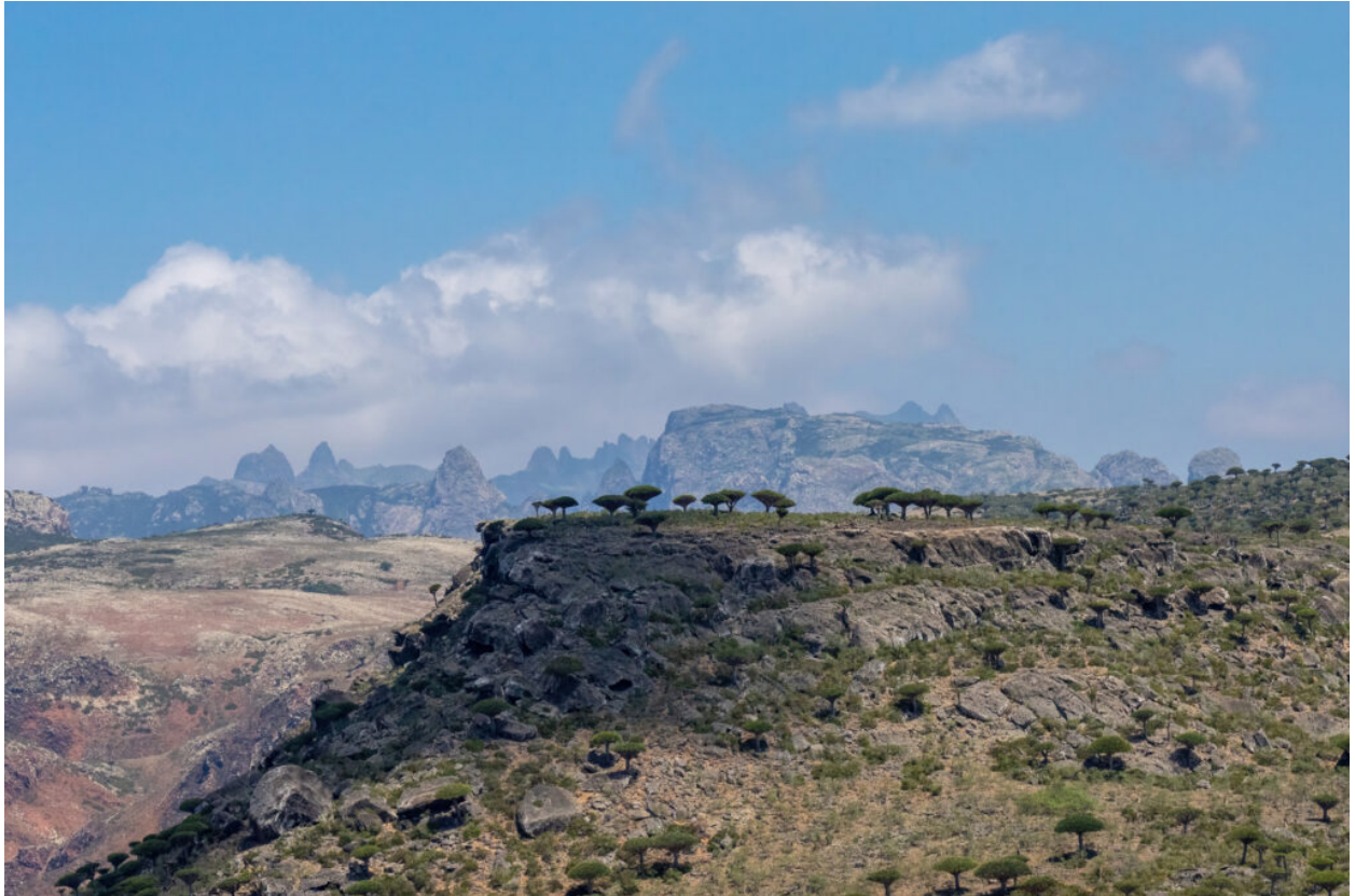
Dragon's Blood Trees on the Diksam Plateau