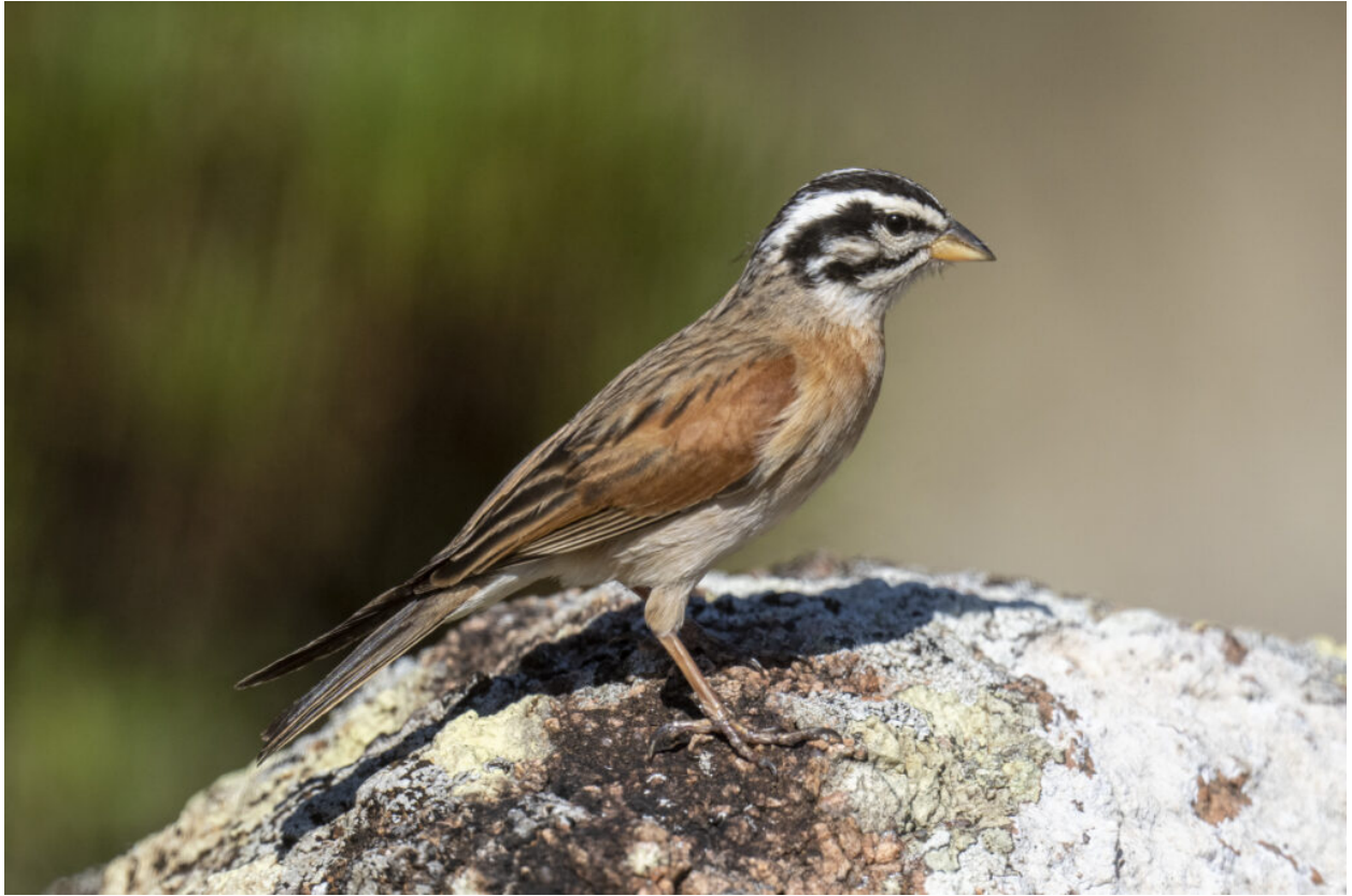
Socotra Bunting