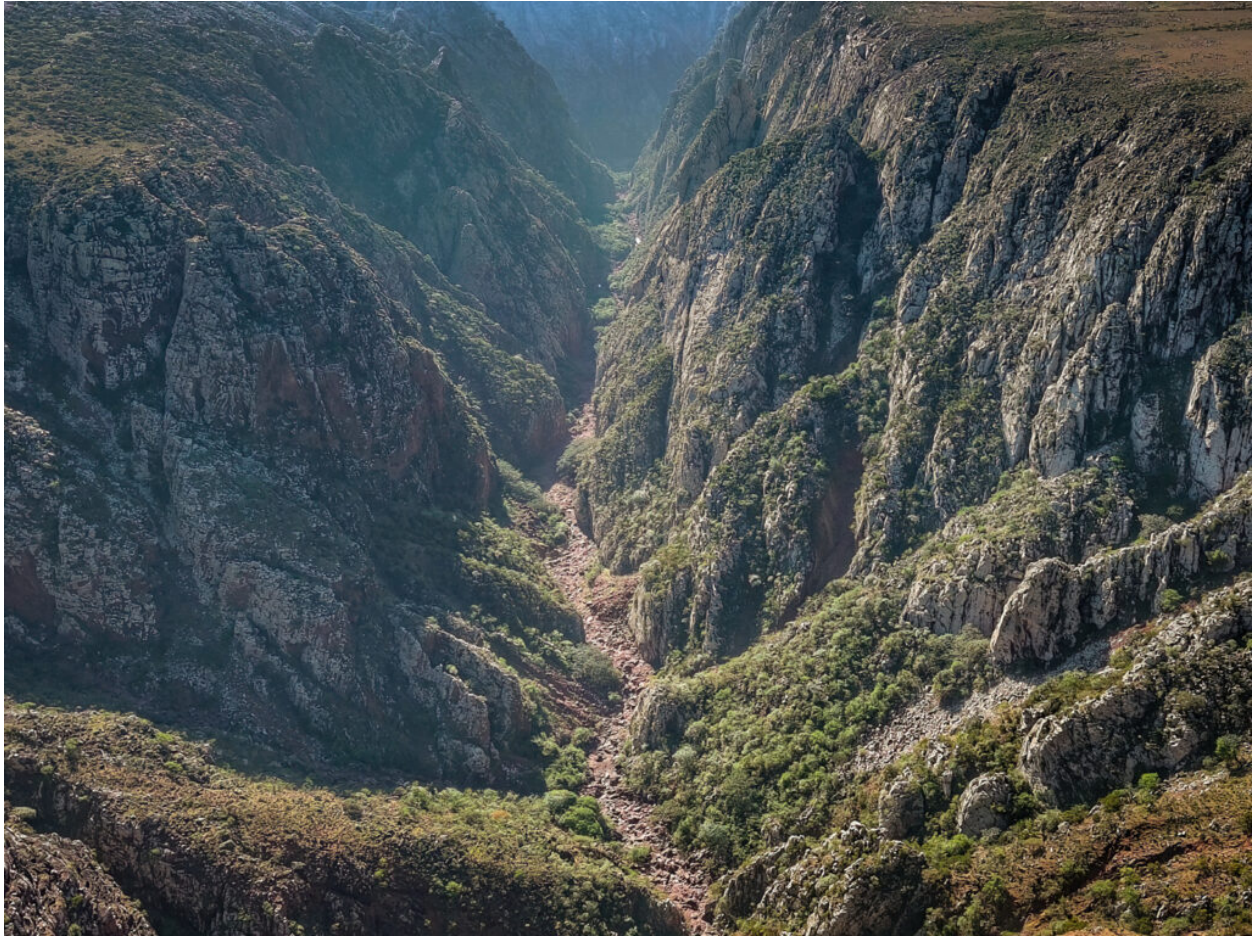
The spectacular and steep canyon sides of Skand in the mountains of Socotra