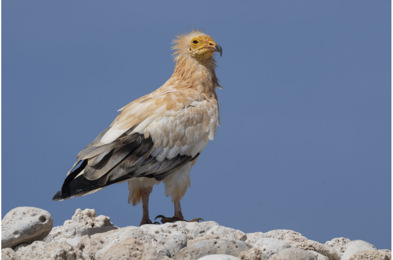
Egyptian Vulture