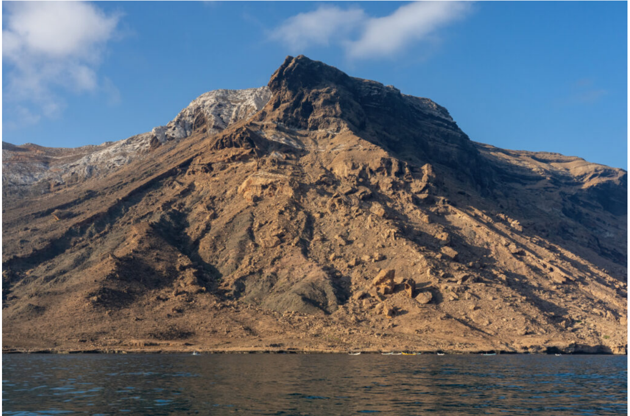
Socotra coastline