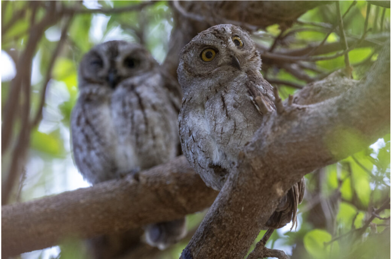
Socotra Scops Owls