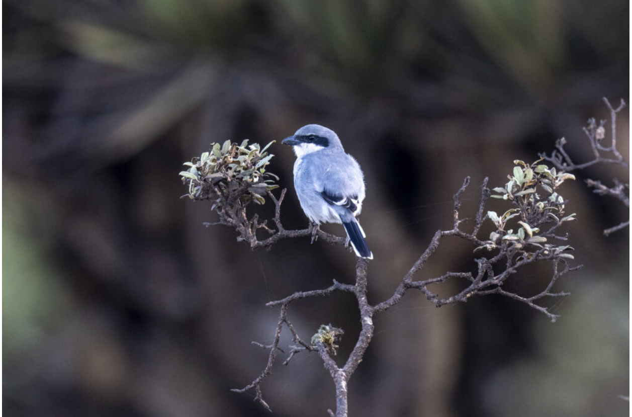
Great Grey Shrike of the endemic form uncinatus