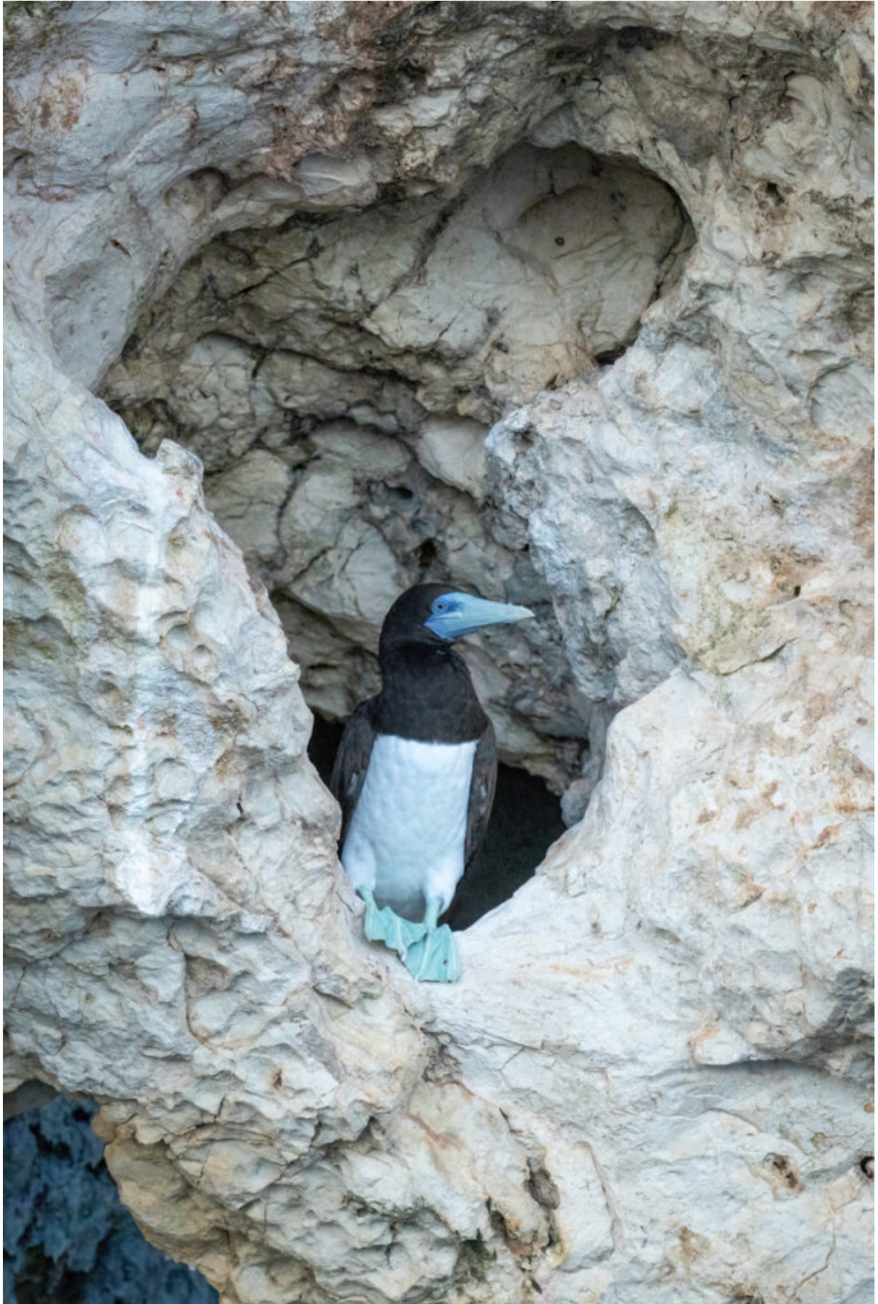
Brown Booby