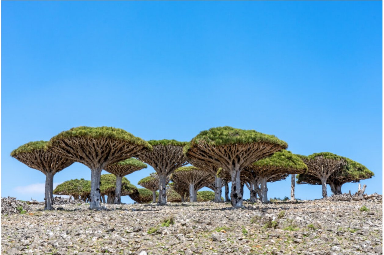
Dragon's Blood Trees have an otherworldly feel