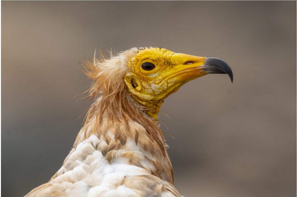
Egyptian Vulture