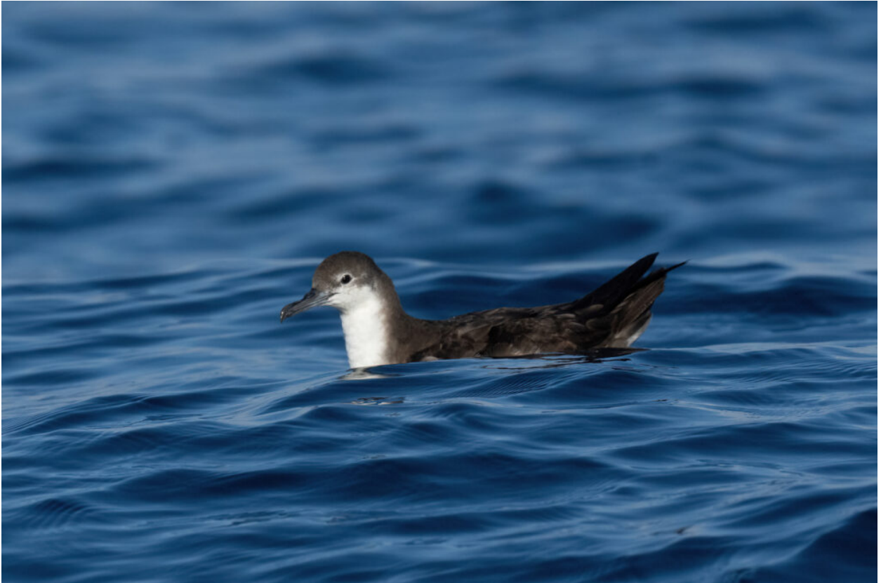
Persian Shearwater