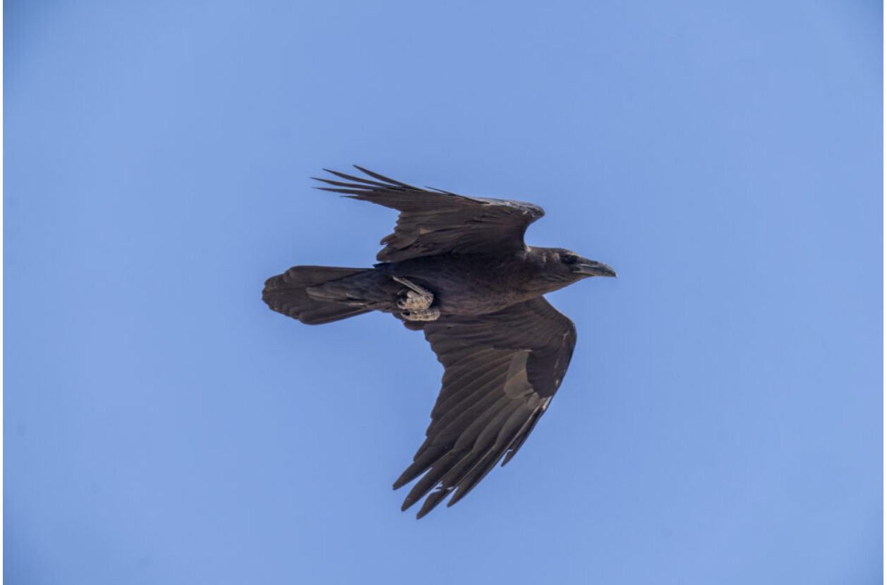
Brown-necked Raven