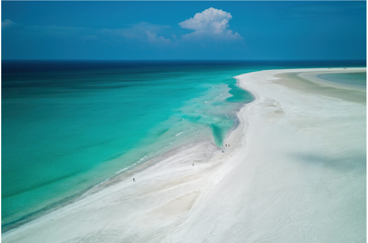
Our group is dwarfed by the gigantic expanse of white sand and turquoise sea at Detwa Lagoon on Socotra