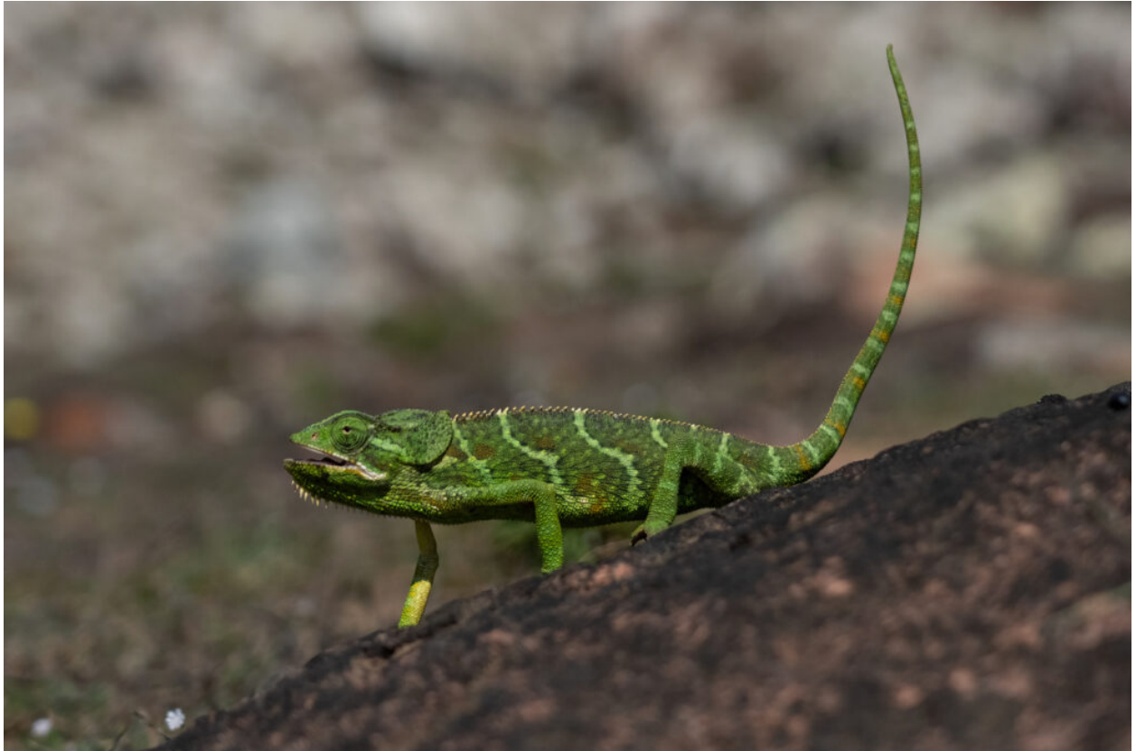
The endemic Socotra Chameleon