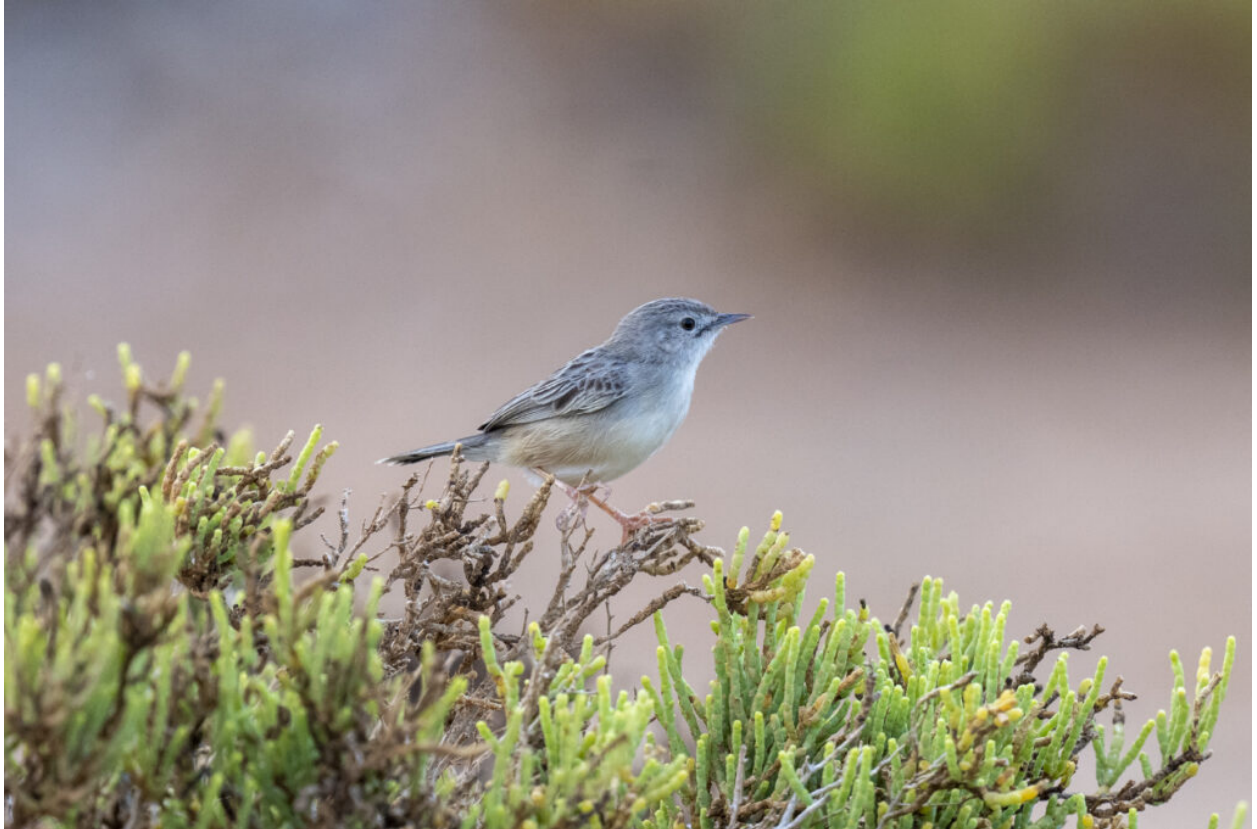
Socotra Cisticola