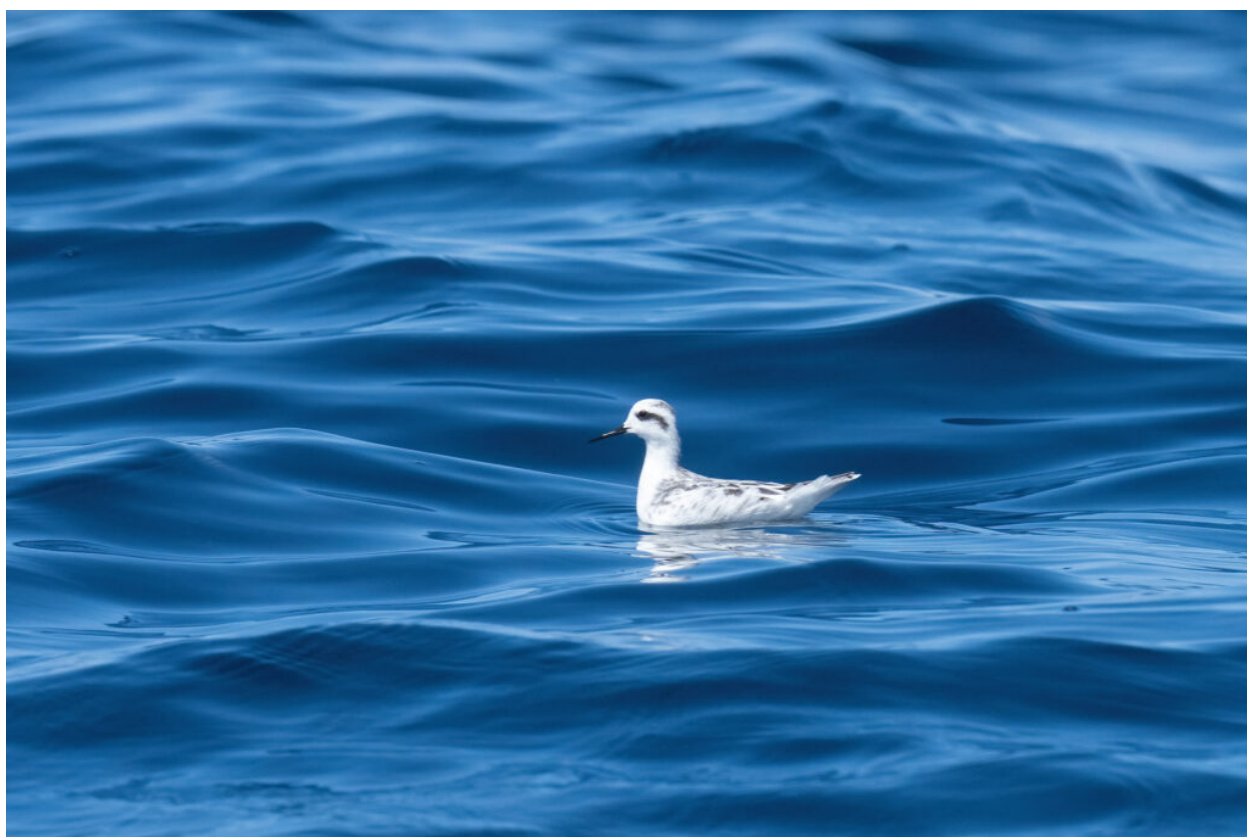
Red-necked Phalarope