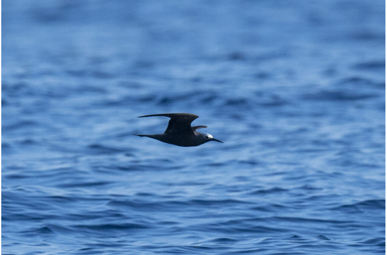
Lesser Noddy