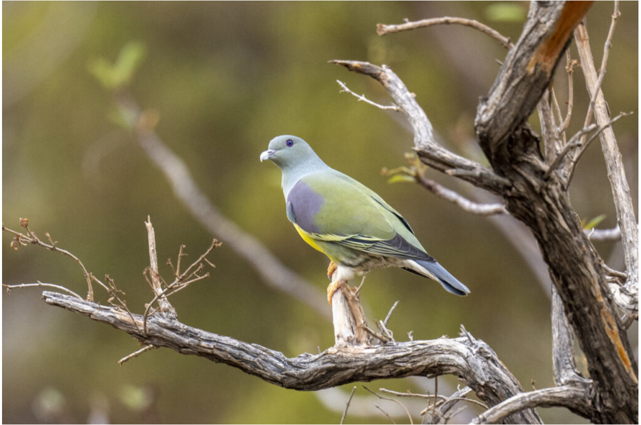
Bruce's Green Pigeon