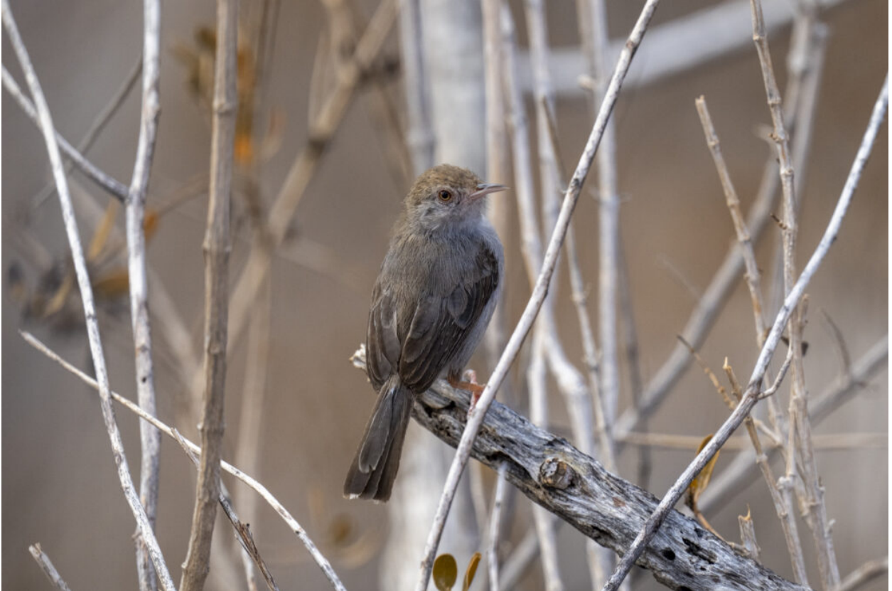
Socotra Warbler