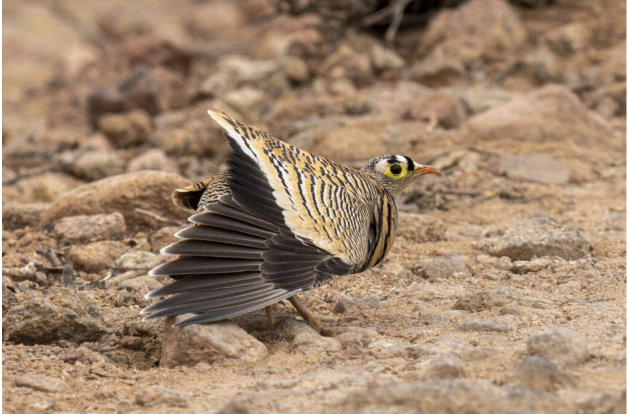
Lichtenstein's Sandgrouse, male