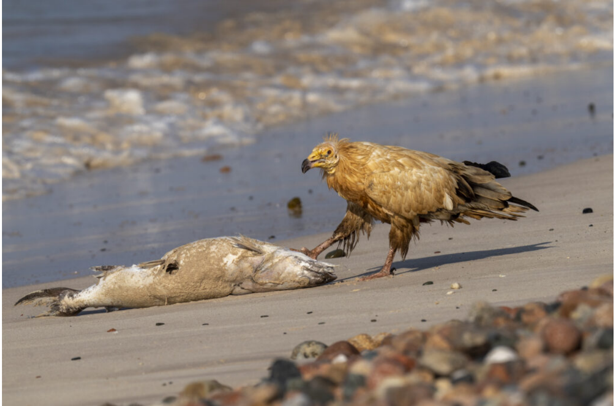
Egyptian Vulture