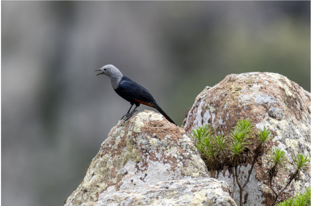
Somali Starling, female