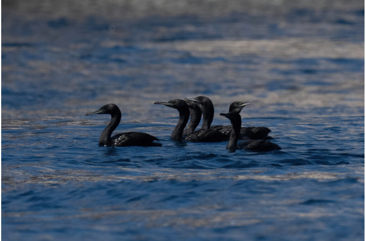
Socotra Cormorants