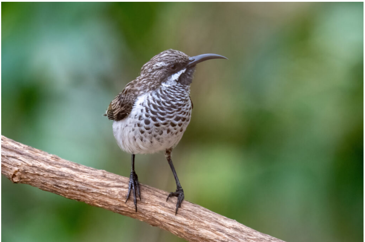
Socotra Sunbird