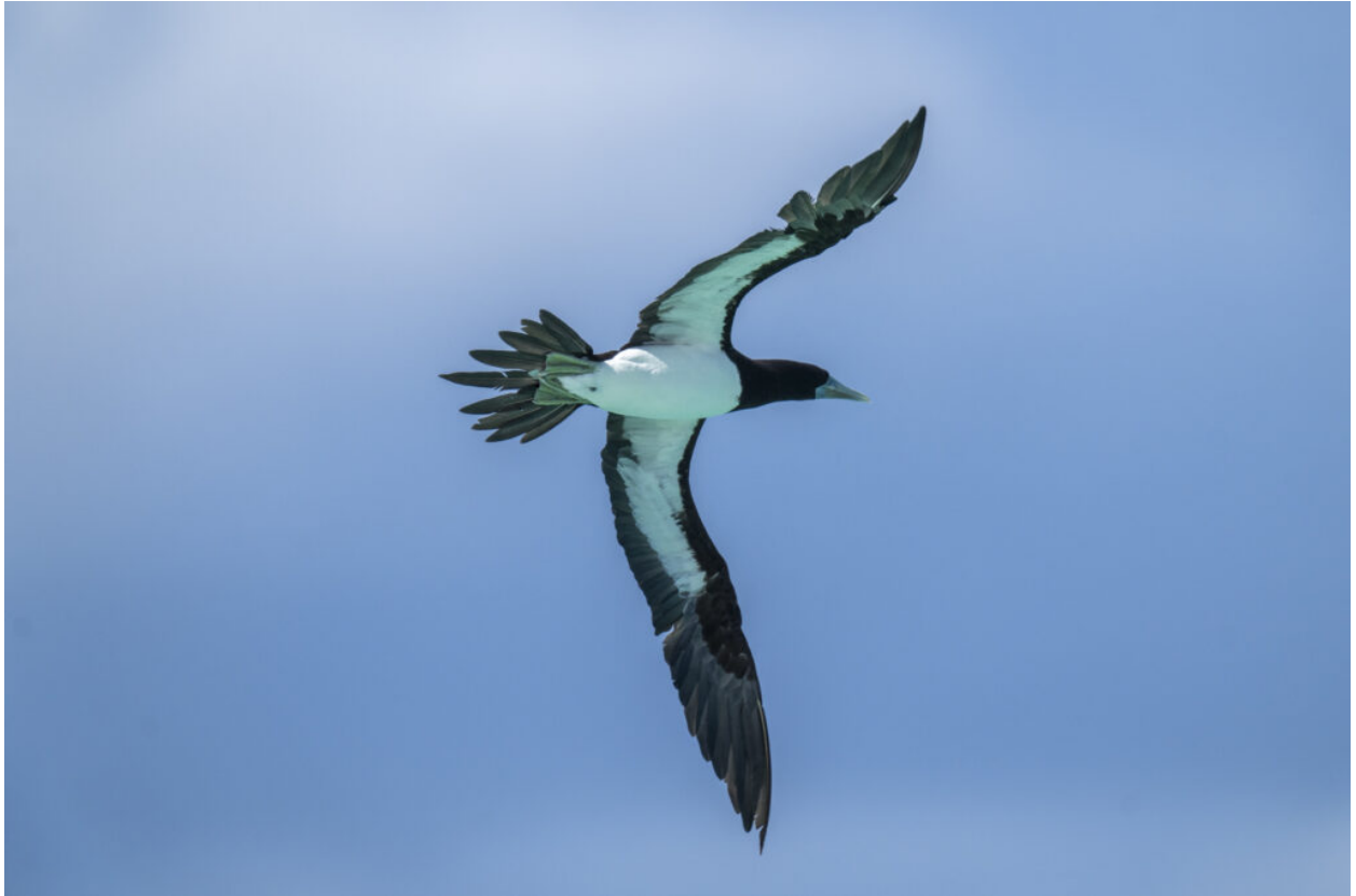
Brown Booby