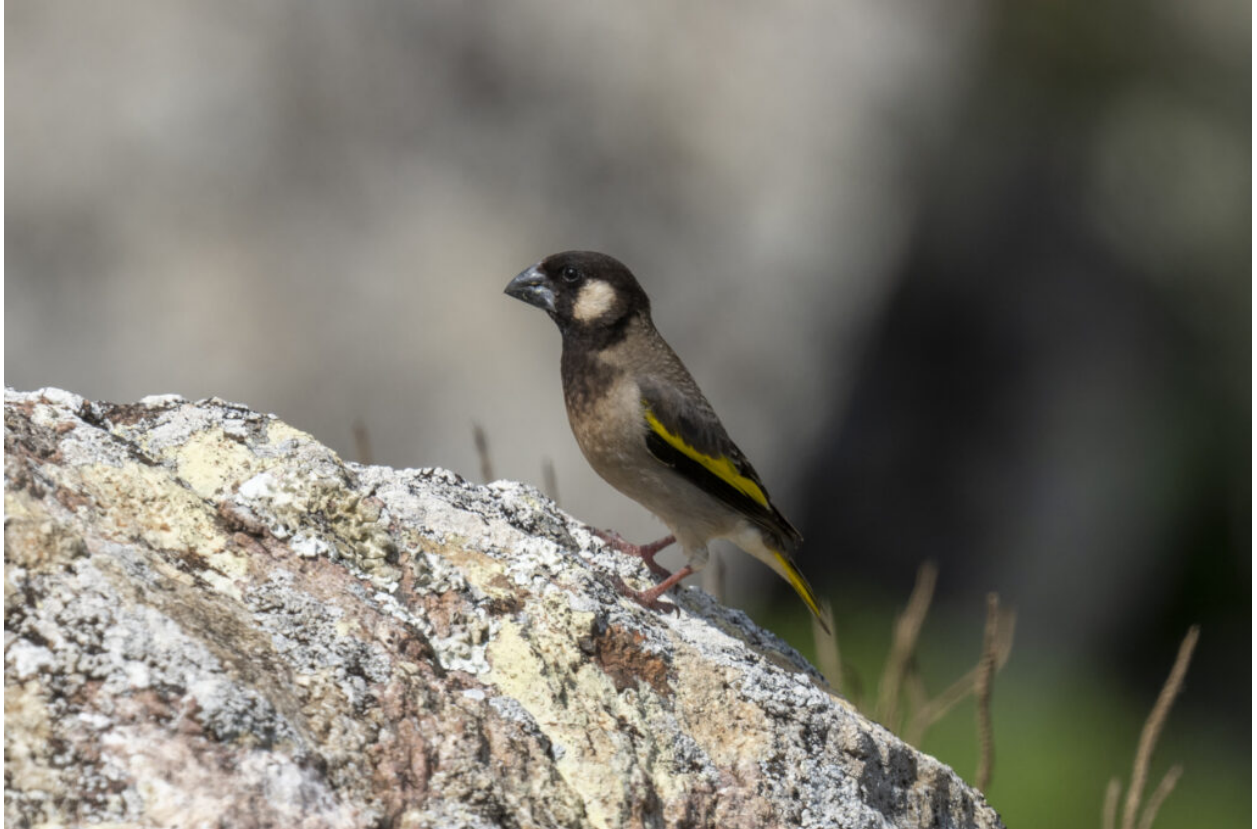
Socotra Golden-winged Grosbeak