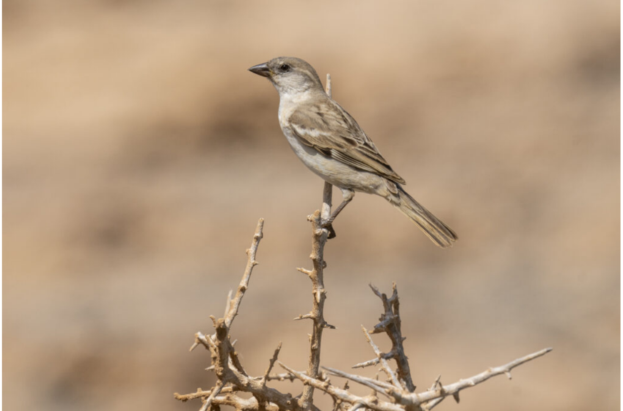
female Abd al-Kuri Sparrow