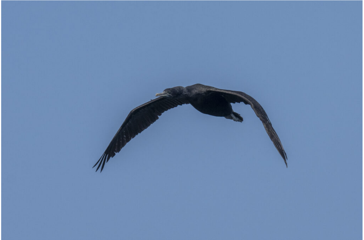
Socotra Cormorant