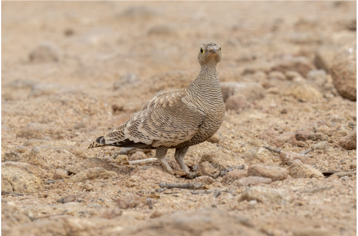
Lichtenstein's Sandgrouse, female