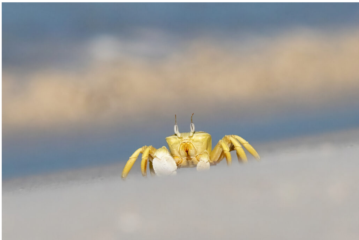
Ghost Crab