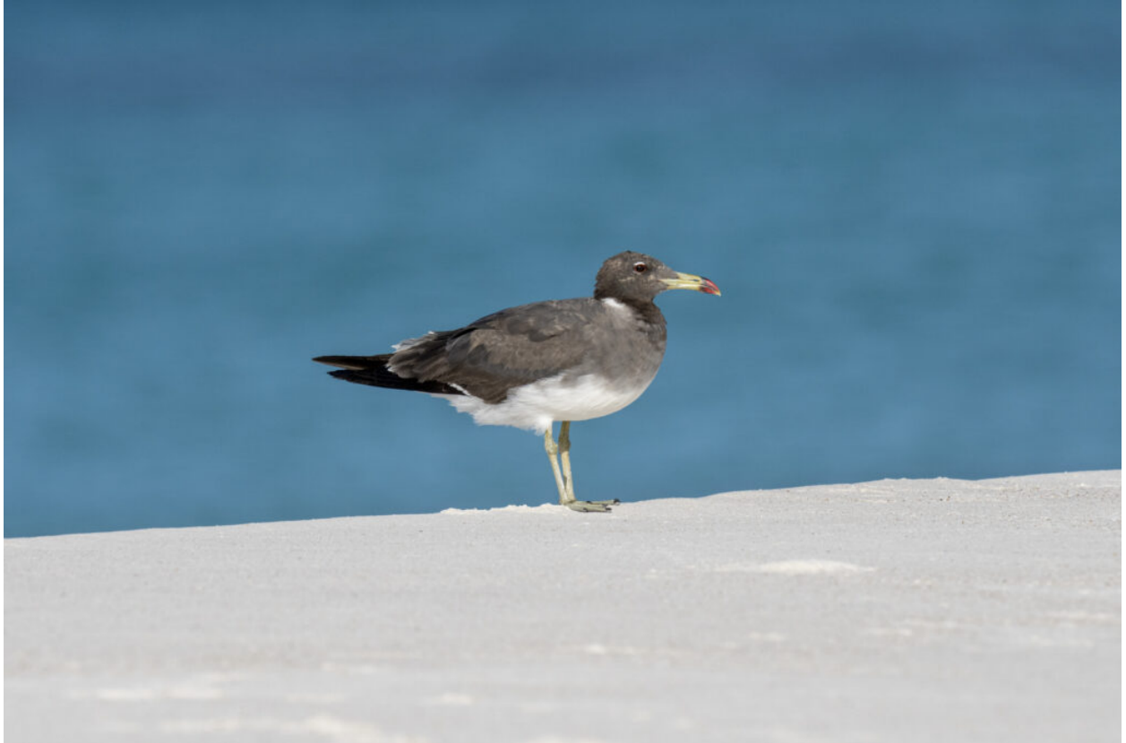
Sooty Gull