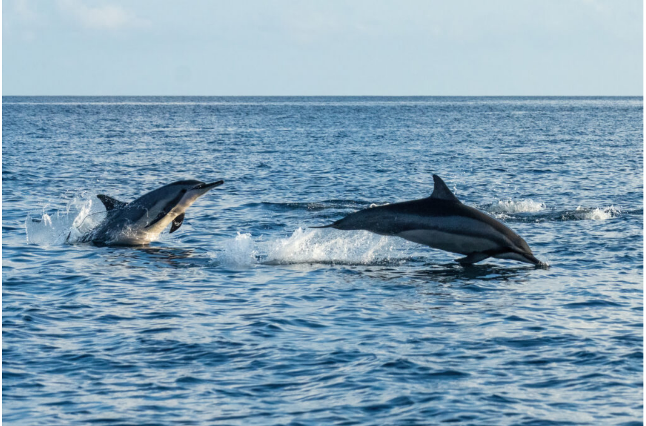
Spinner Dolphins