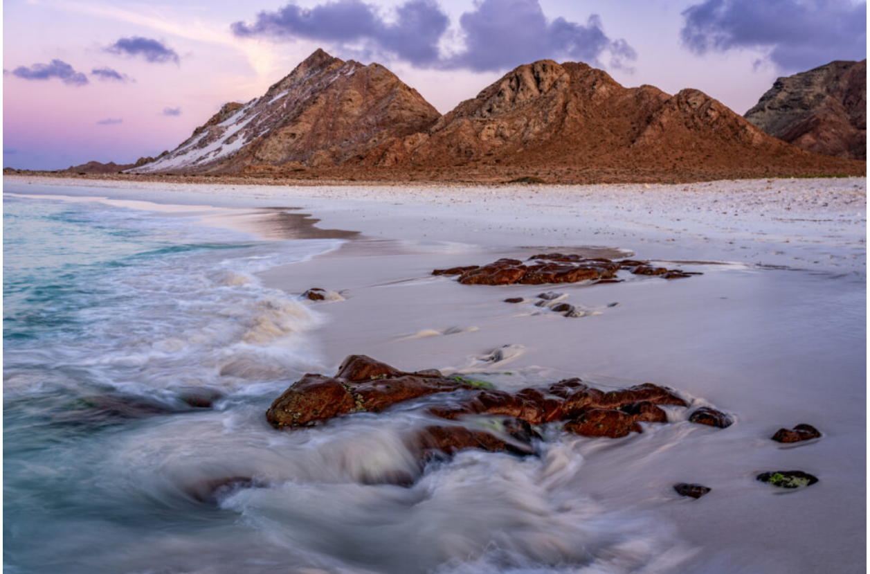
One of Abd al Kuri's most beautiful beaches