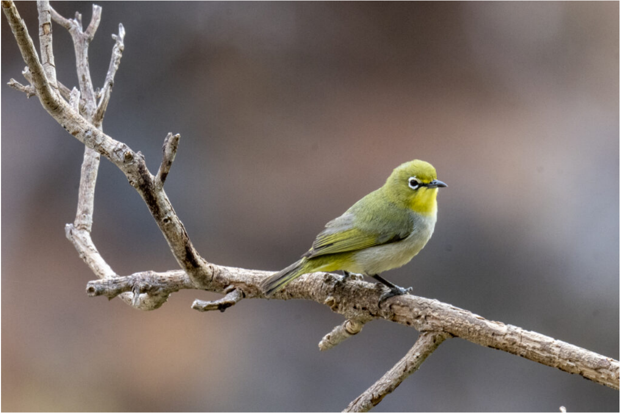
Socotra White-eye