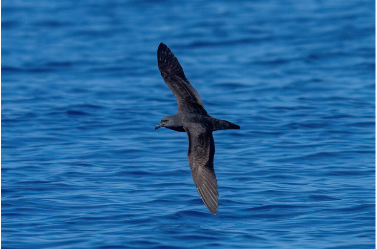
Jouanin's Petrel