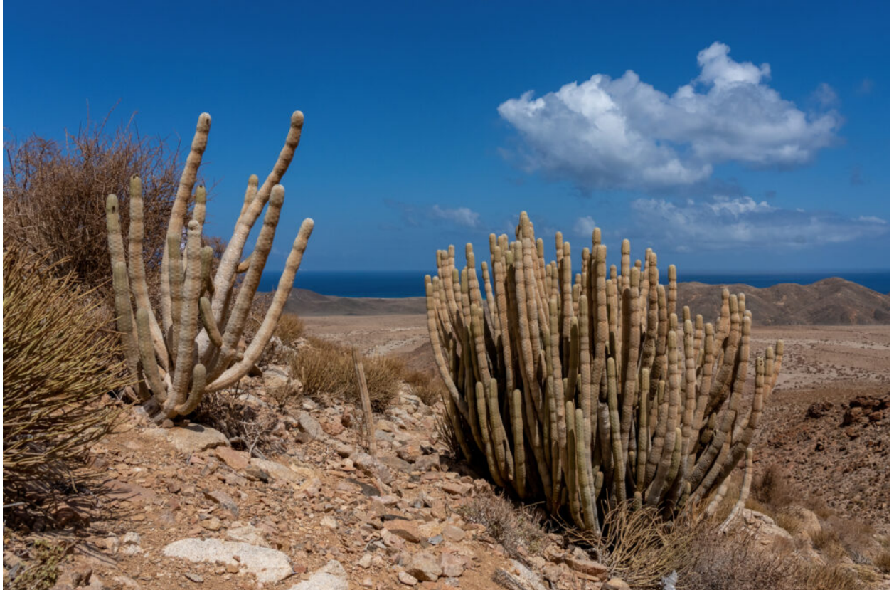
The endemic Abd al Kuri Euphorbia grows to three metres in height