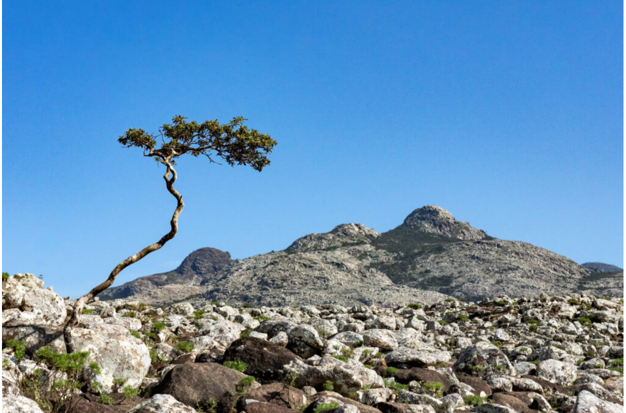
The mountainous interior of Socotra