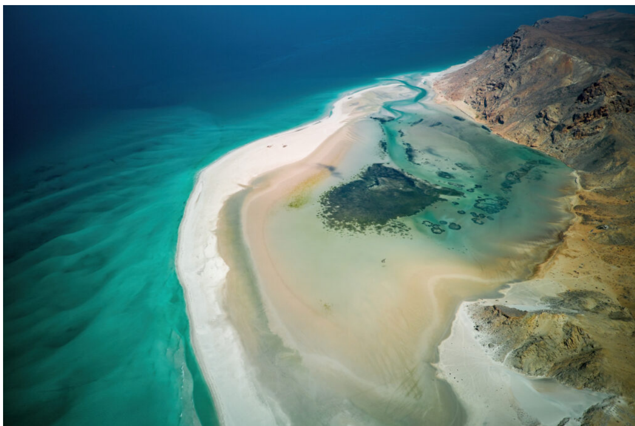
Detwa Lagoon on Socotra is truly spectacular from the air