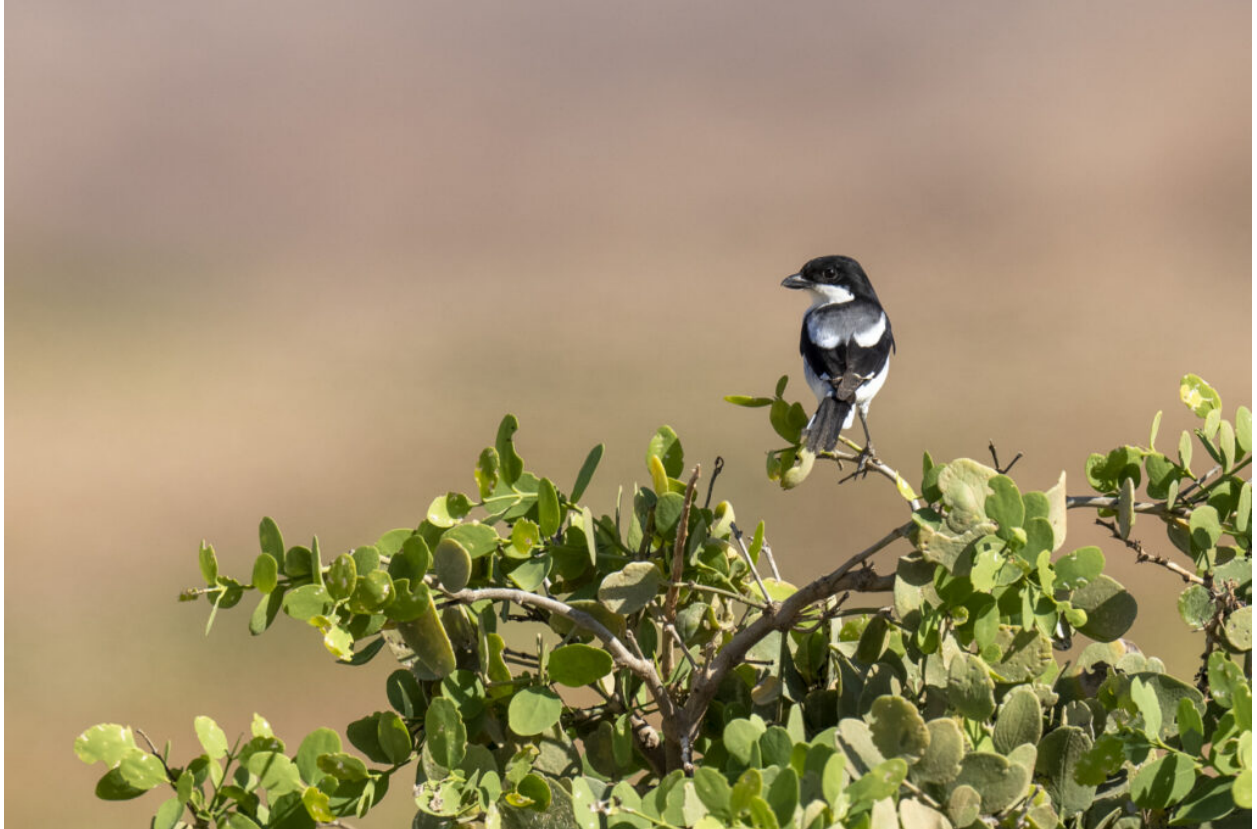
Somali Fiscal