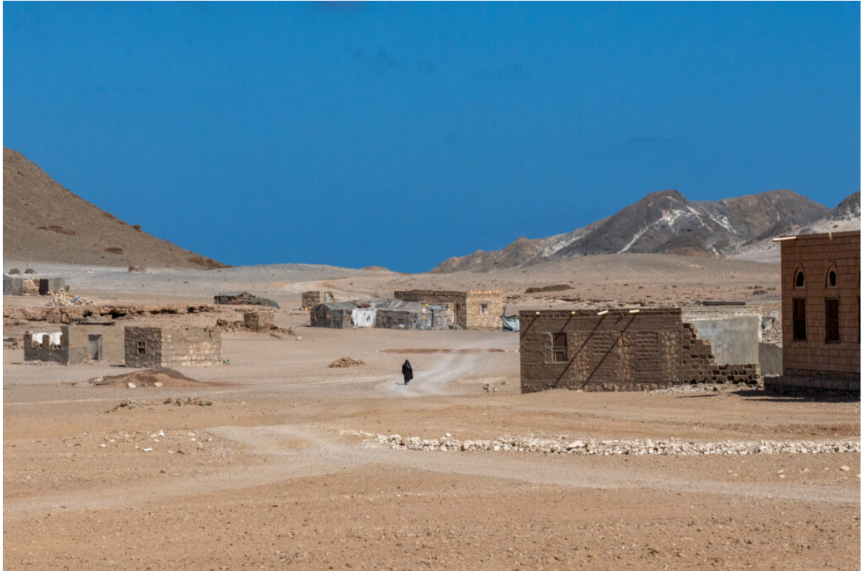
Barren and windswept, the villages on Abd al Kuri are home to extremely friendly, yet hardy, people