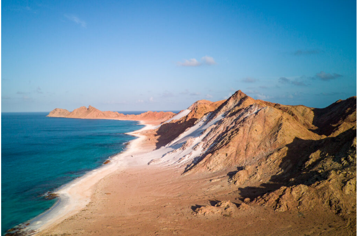
The rugged dune and mountain landscapes of Abd al Kuri