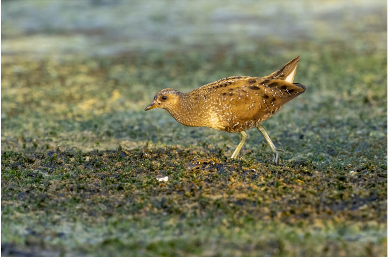
Spotted Crane