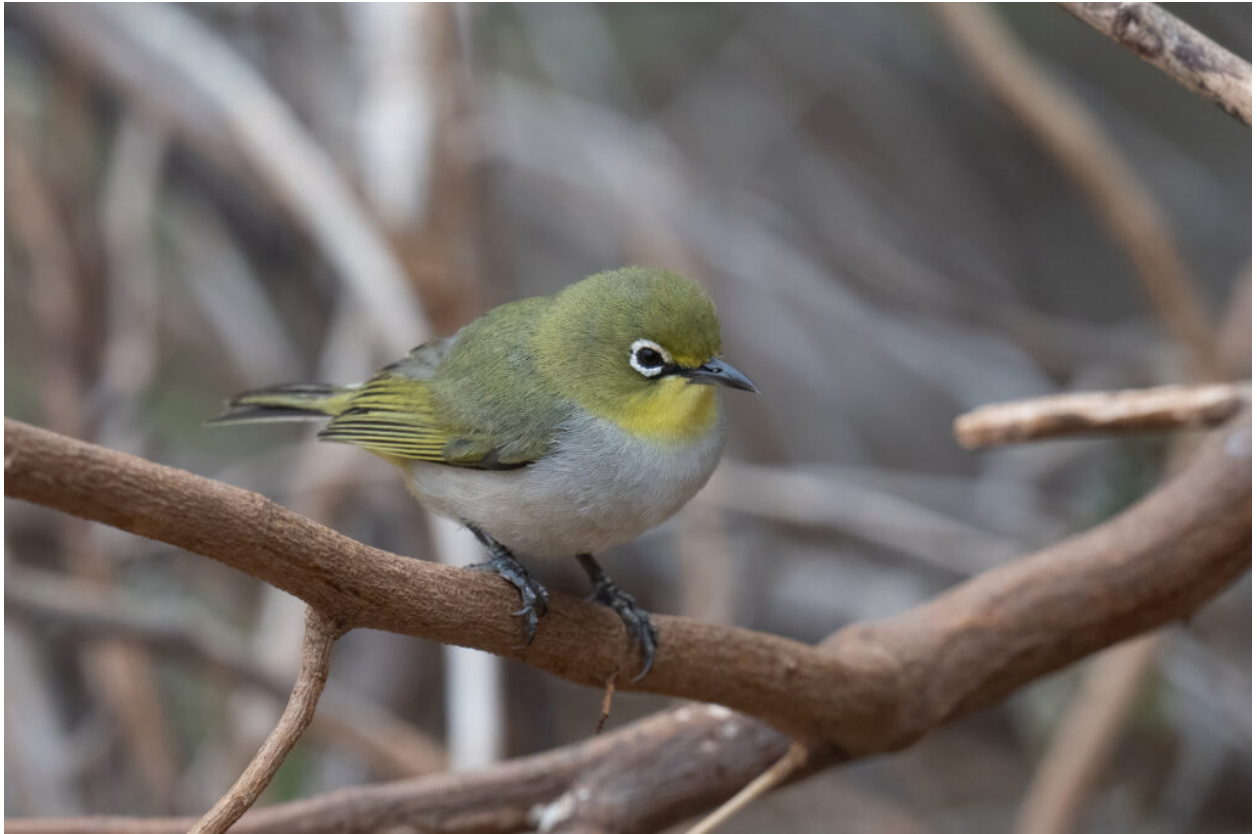
Socotra White-eye