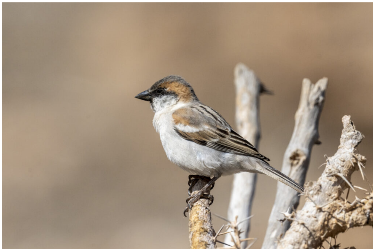
male Abd al-Kuri Sparrow