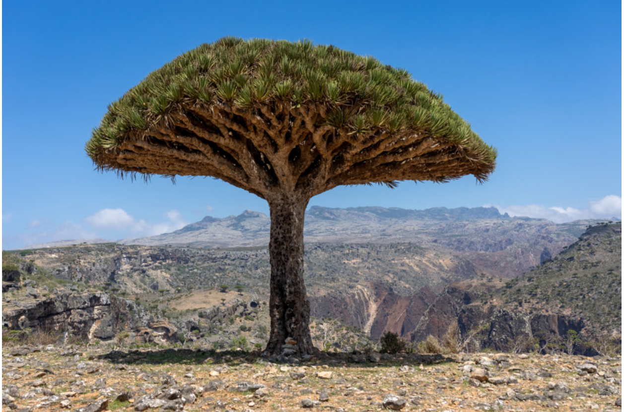
A solitary Dragon's Blood Tree