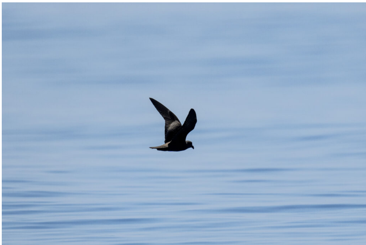
Swinhoe's Storm Petrel