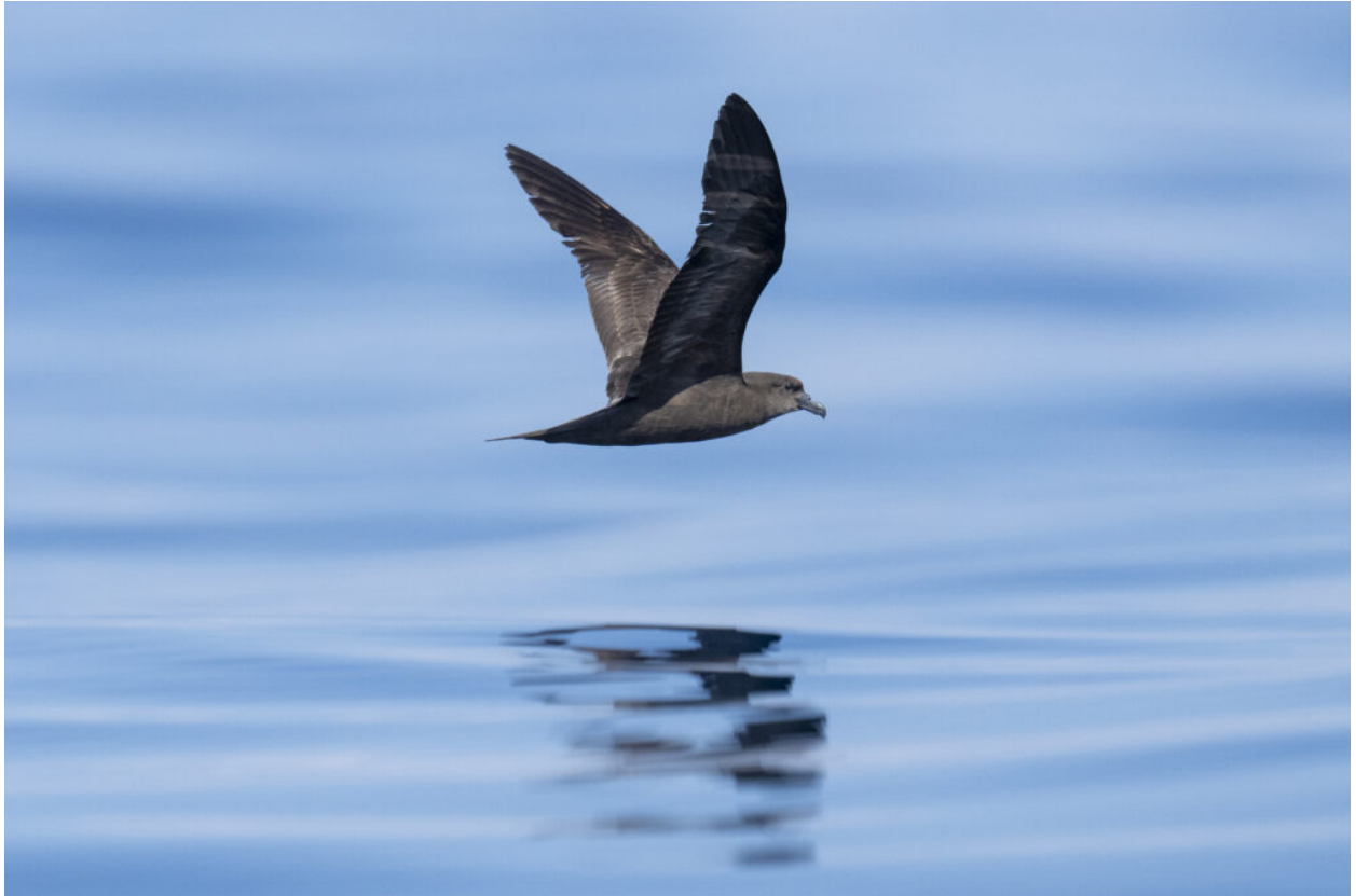
Jouanin's Petrel