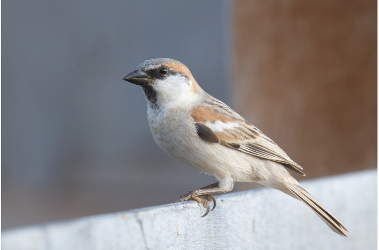
male Abd al-Kuri Sparrow (image by Inger Vandyke)