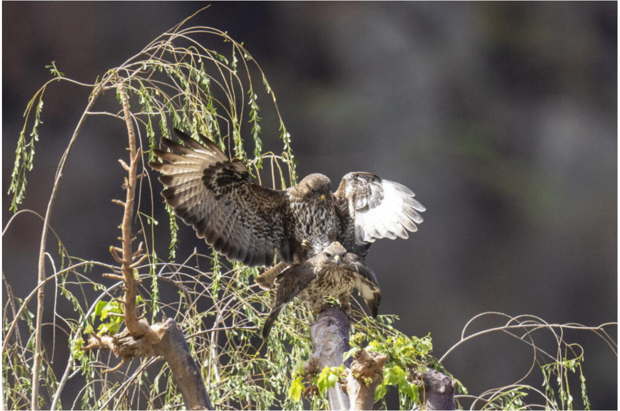
Socotra Buzzards mating