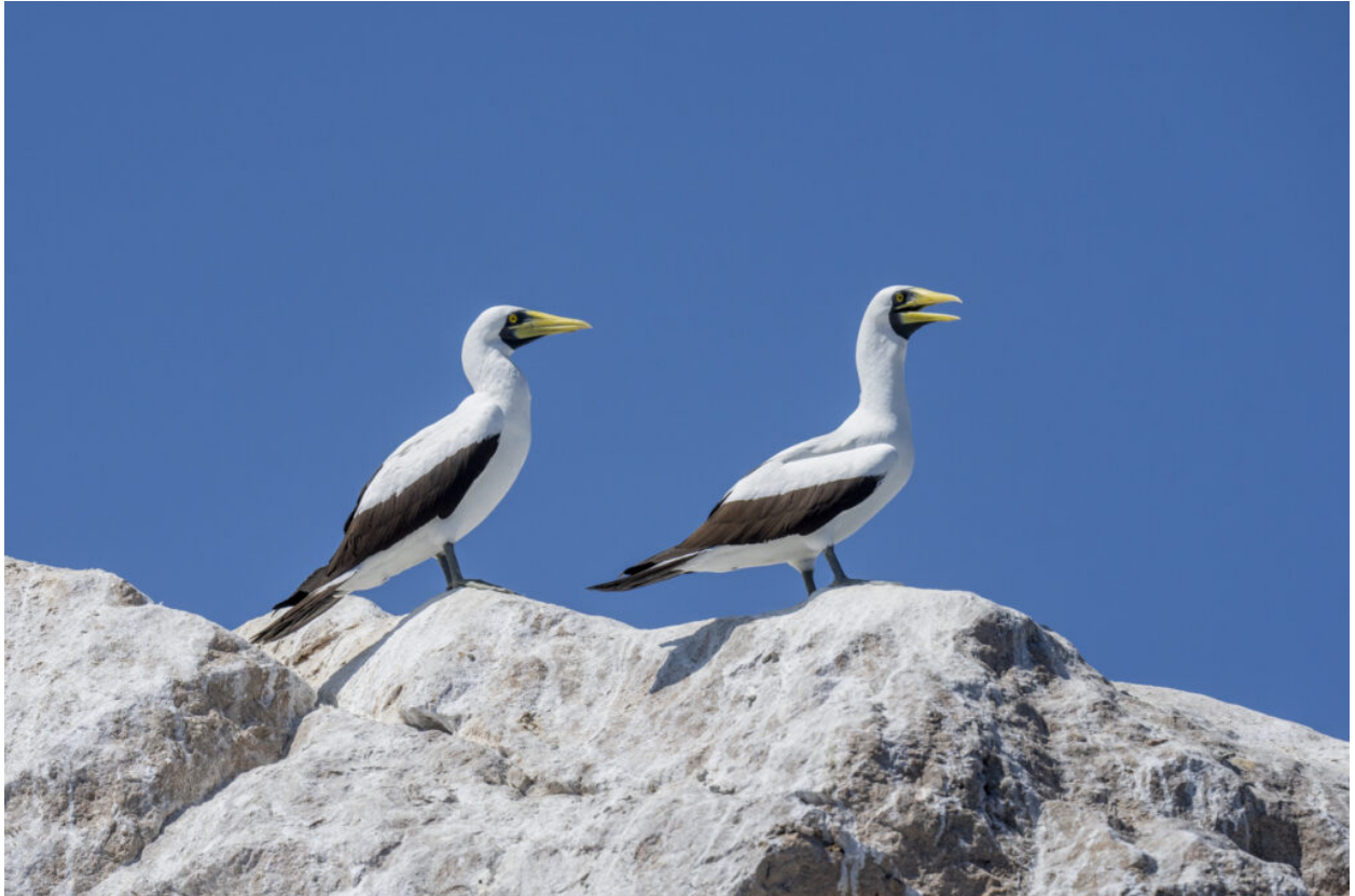
Masked Boobies