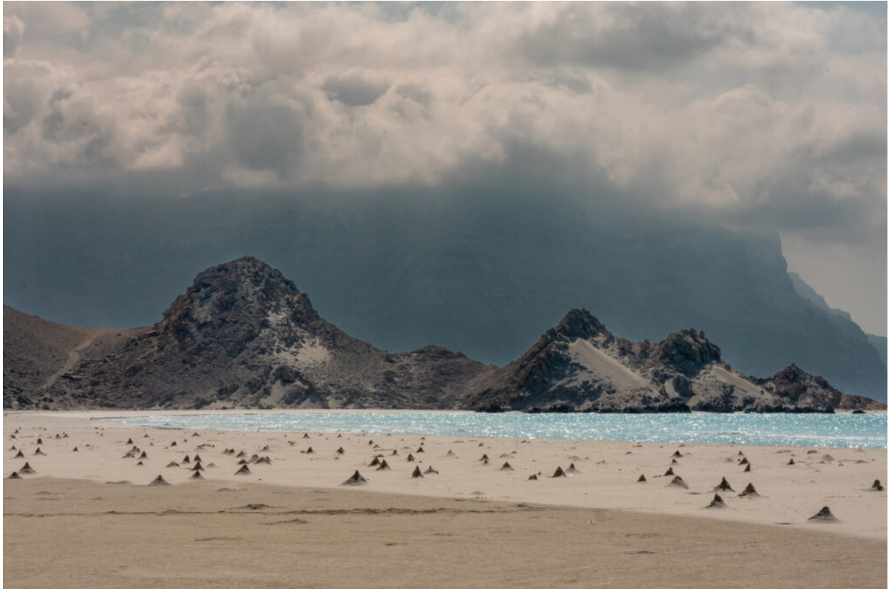
Socotra's Ghost Crabs build mounds to attract a mate and form a 'crab city'