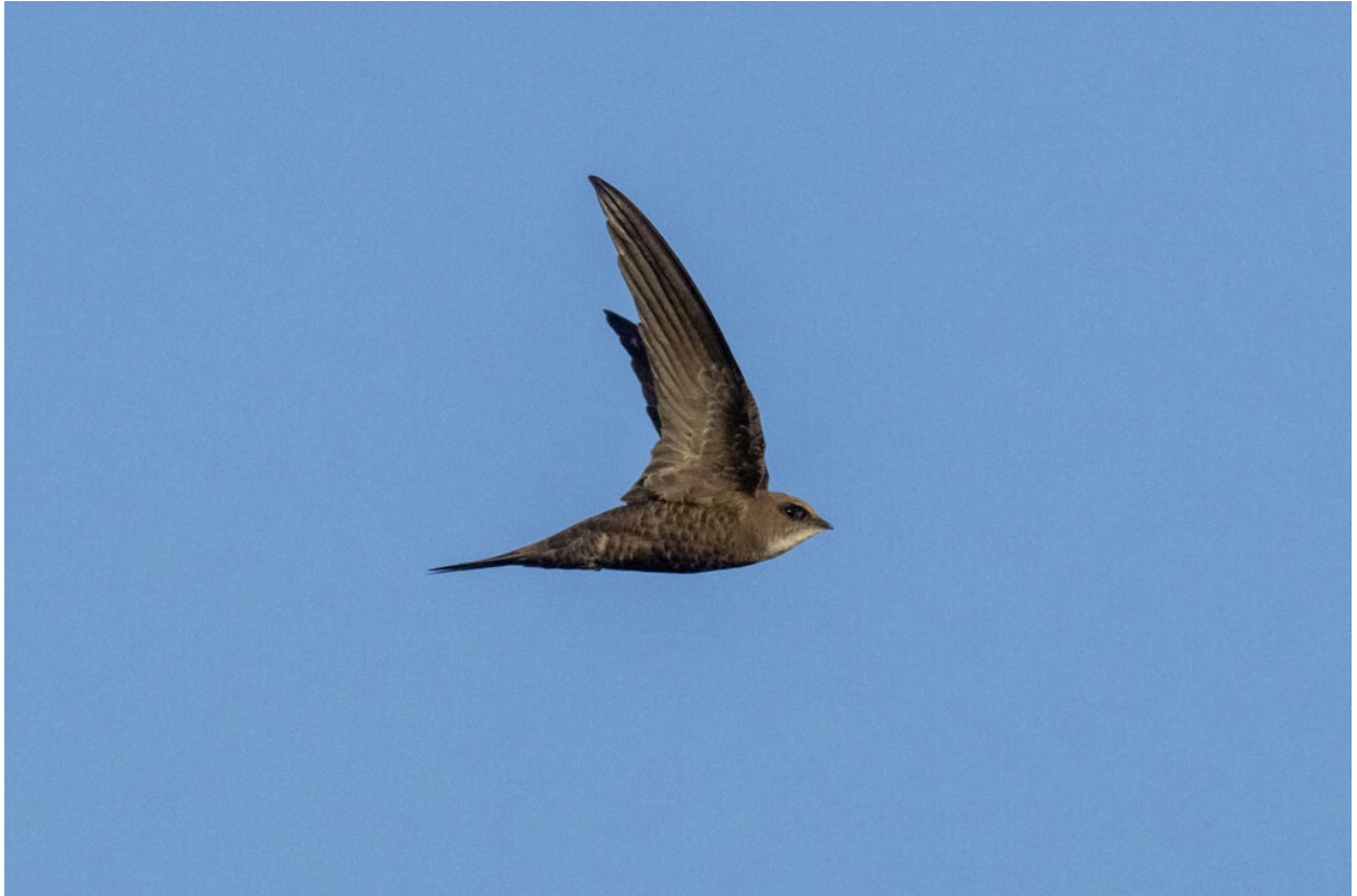
Forbes-Watson's Swift