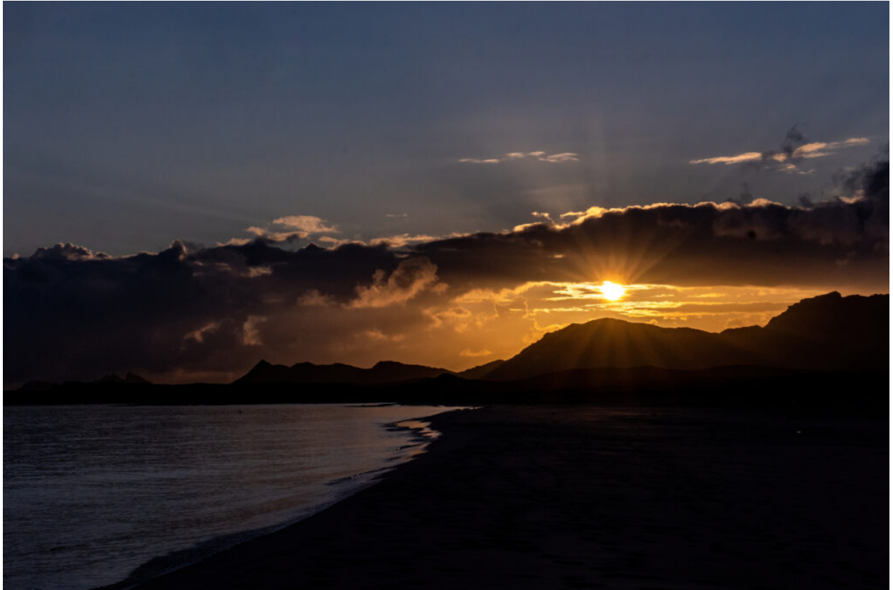
Sunrise on remote Abd al Kuri