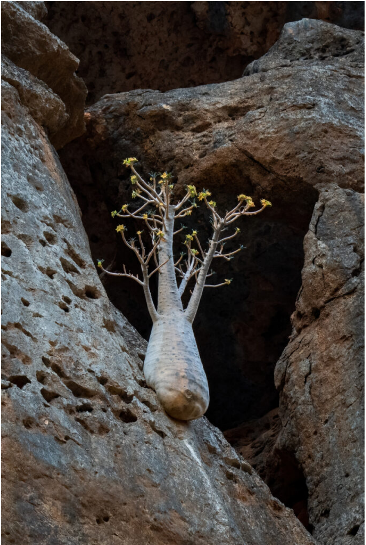
A flowering bottle tree clings to life on the cliffs