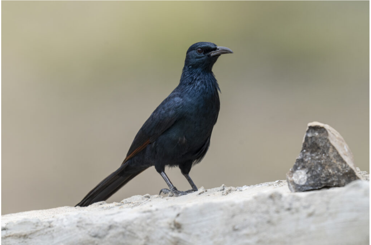
Socotra Starling