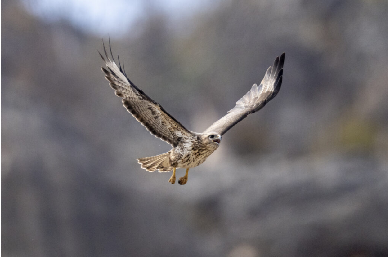
Socotra Buzzard