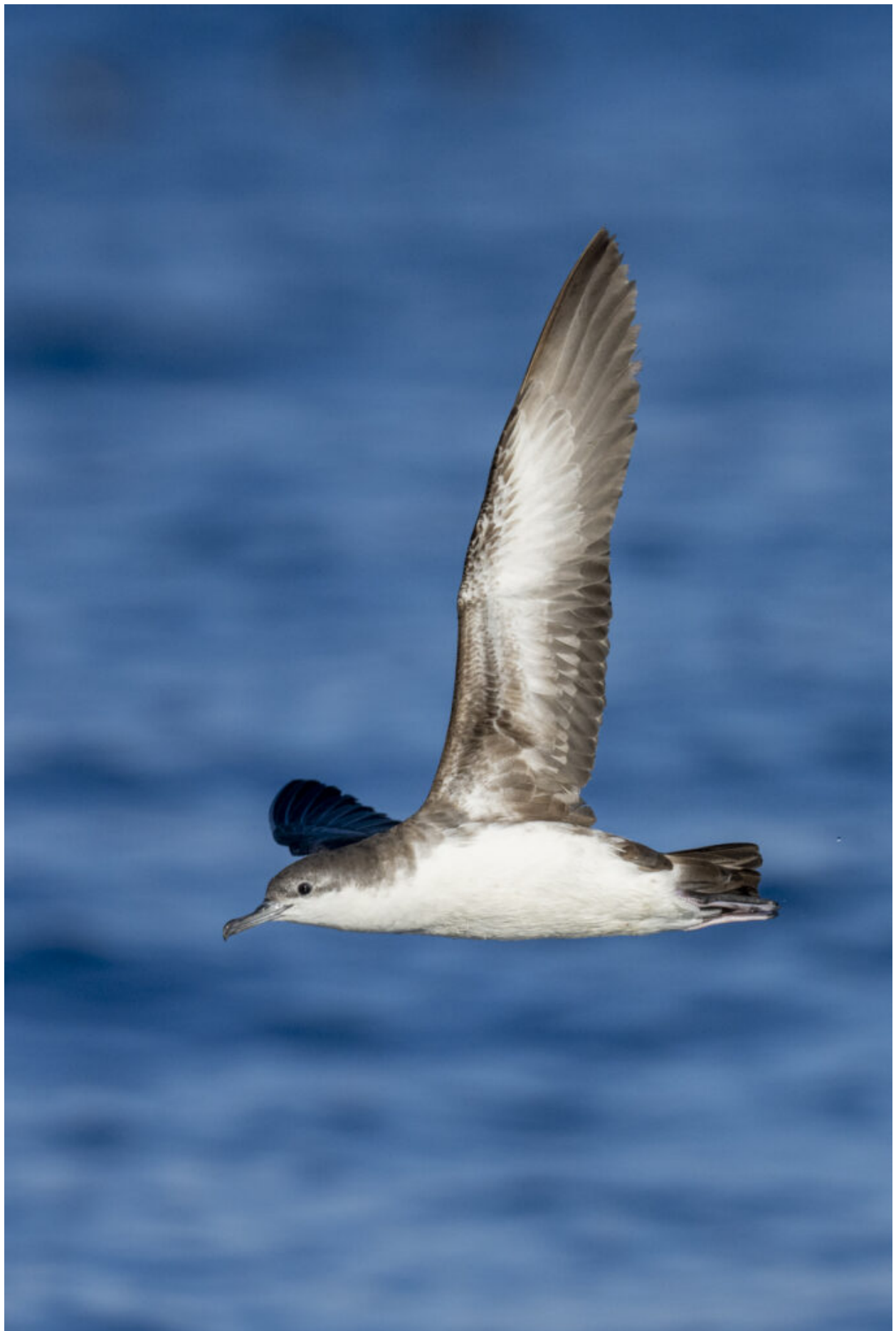
Persian Shearwater