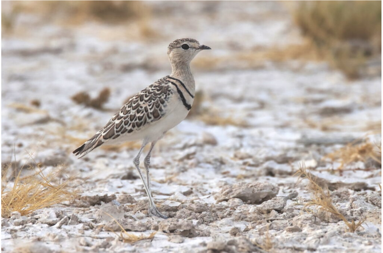
Double-banded Courser