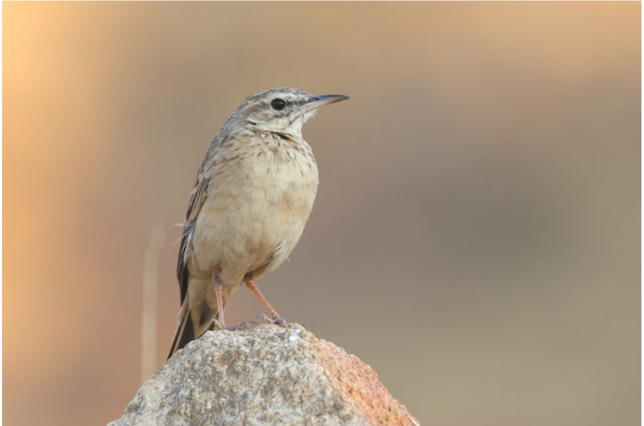
Nicholson's Pipit