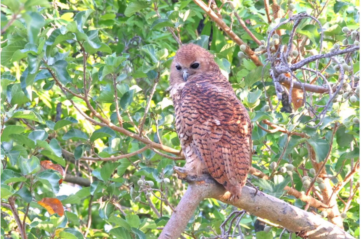
Pel's Fishing Owl