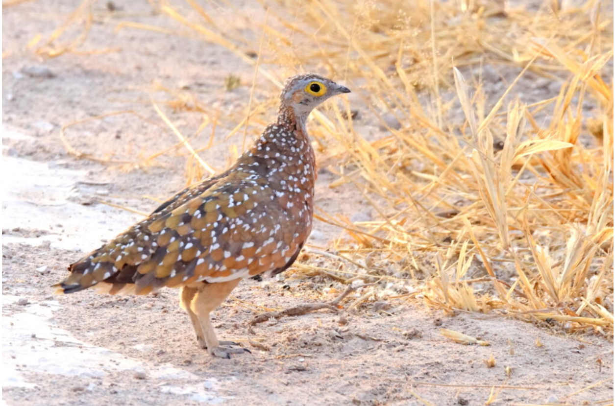
Burchell's Sandgrouse