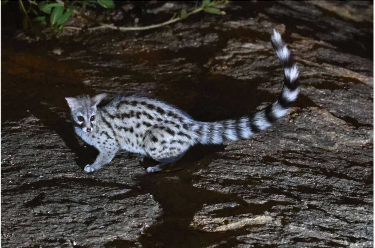
Common Genet