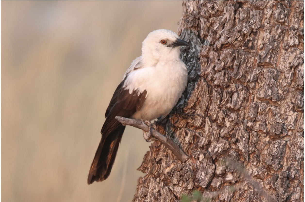
Southern Pied Babbler