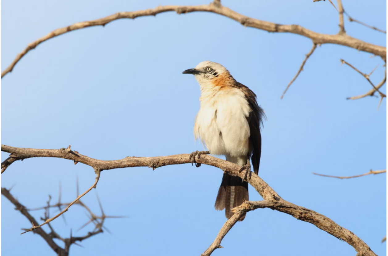
Bare-cheeked Babbler