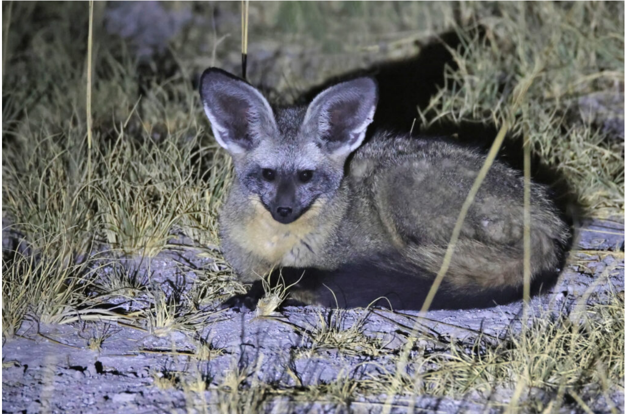
Bat-eared Fox