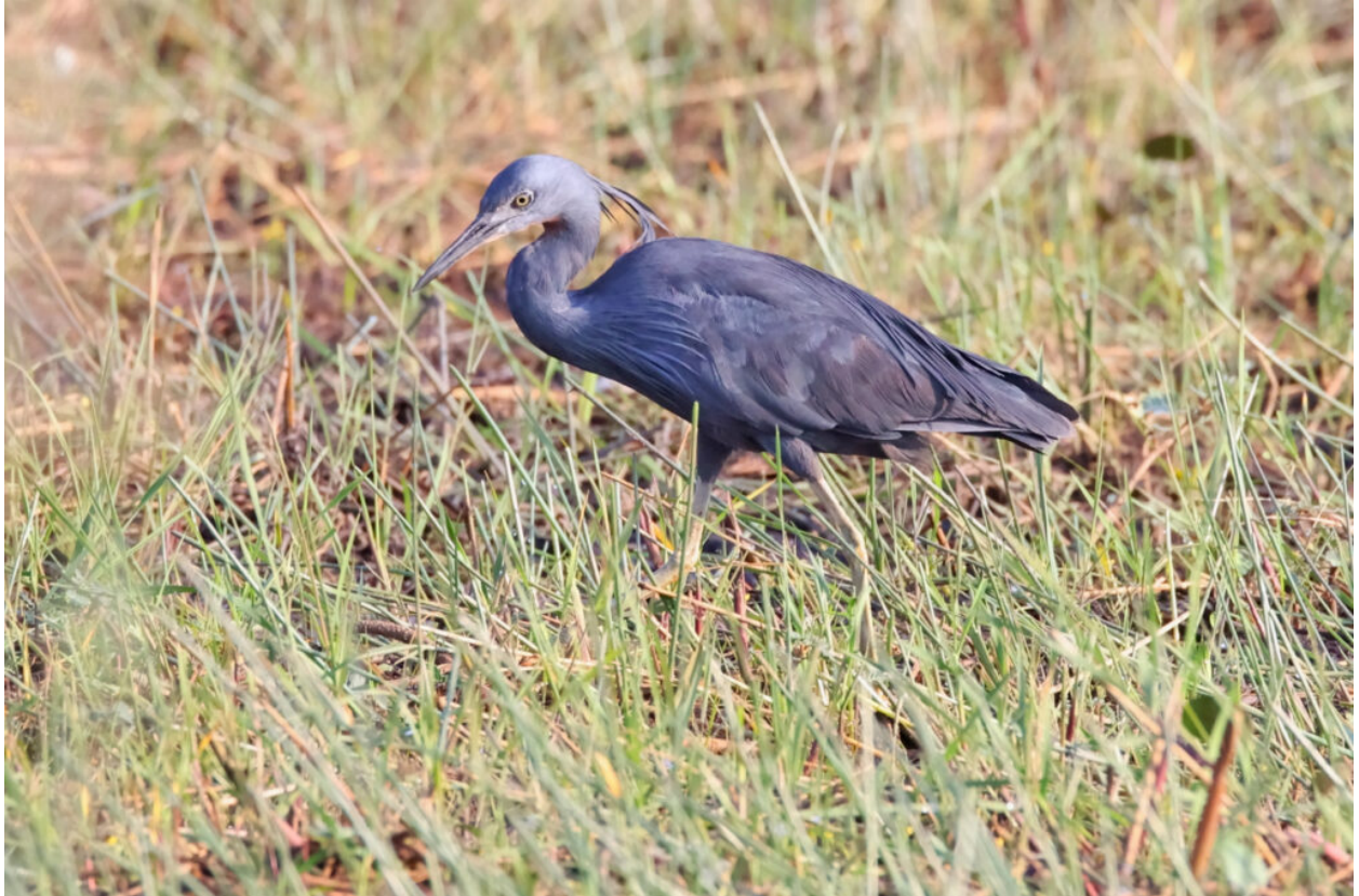
Slaty Egret