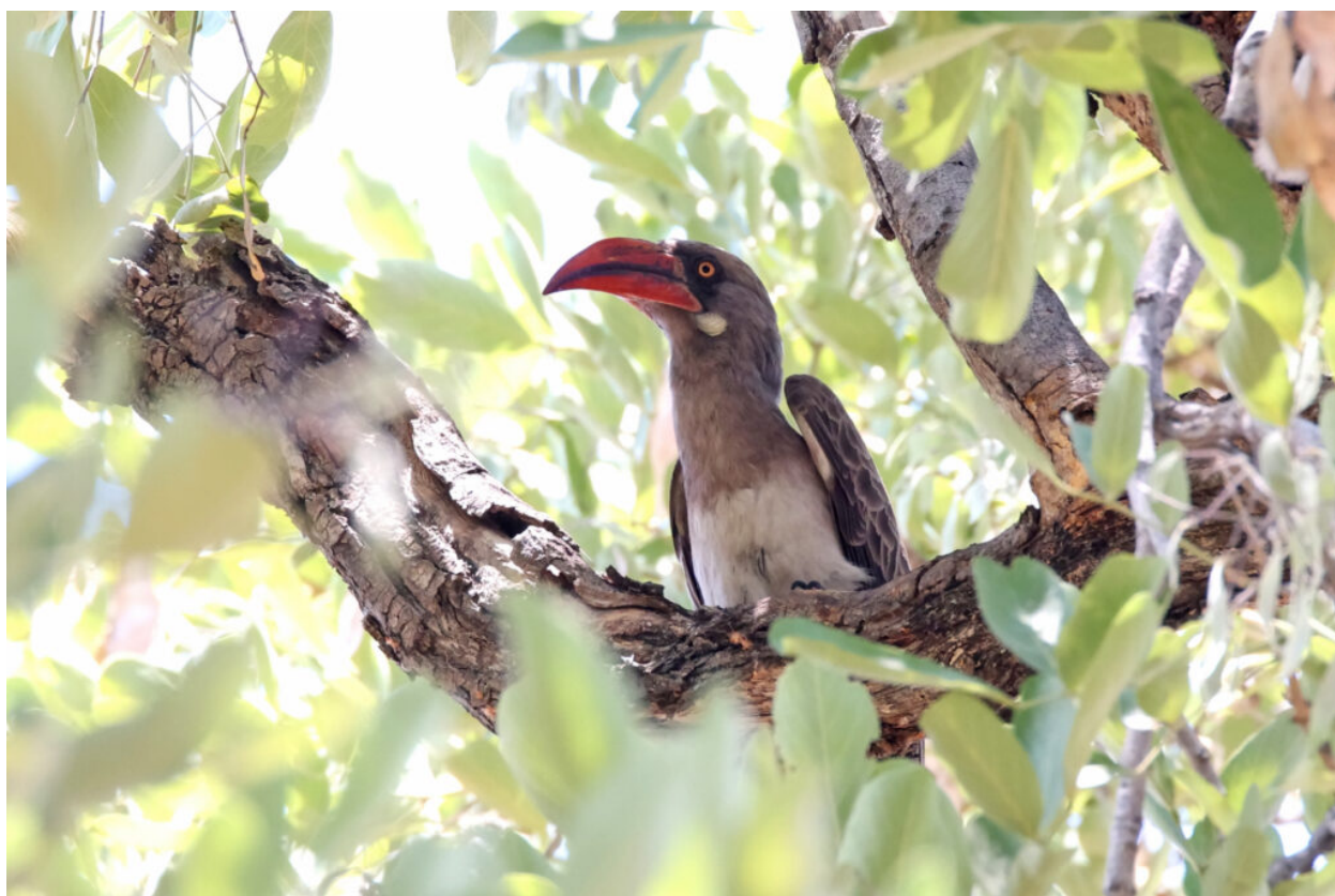
Bradfield's Hornbill