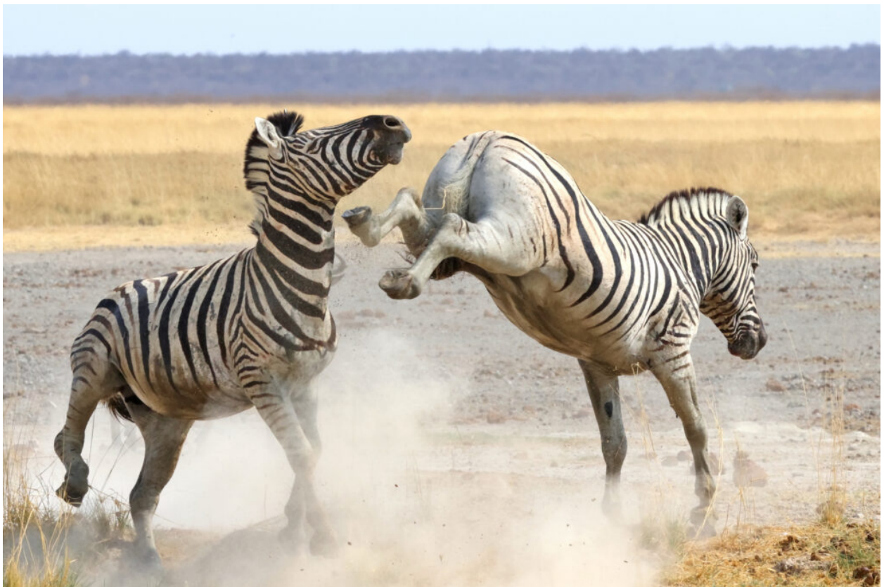
Plains Zebras