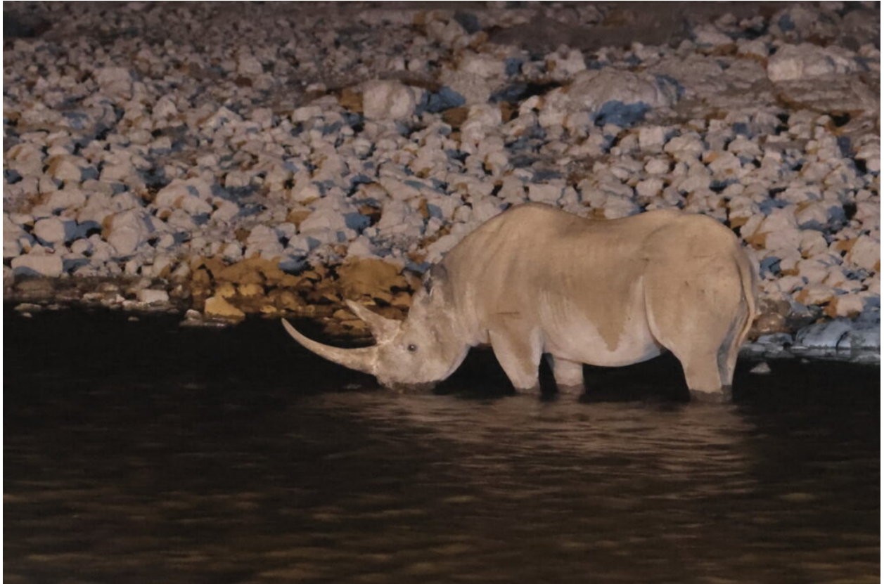
Black Rhino