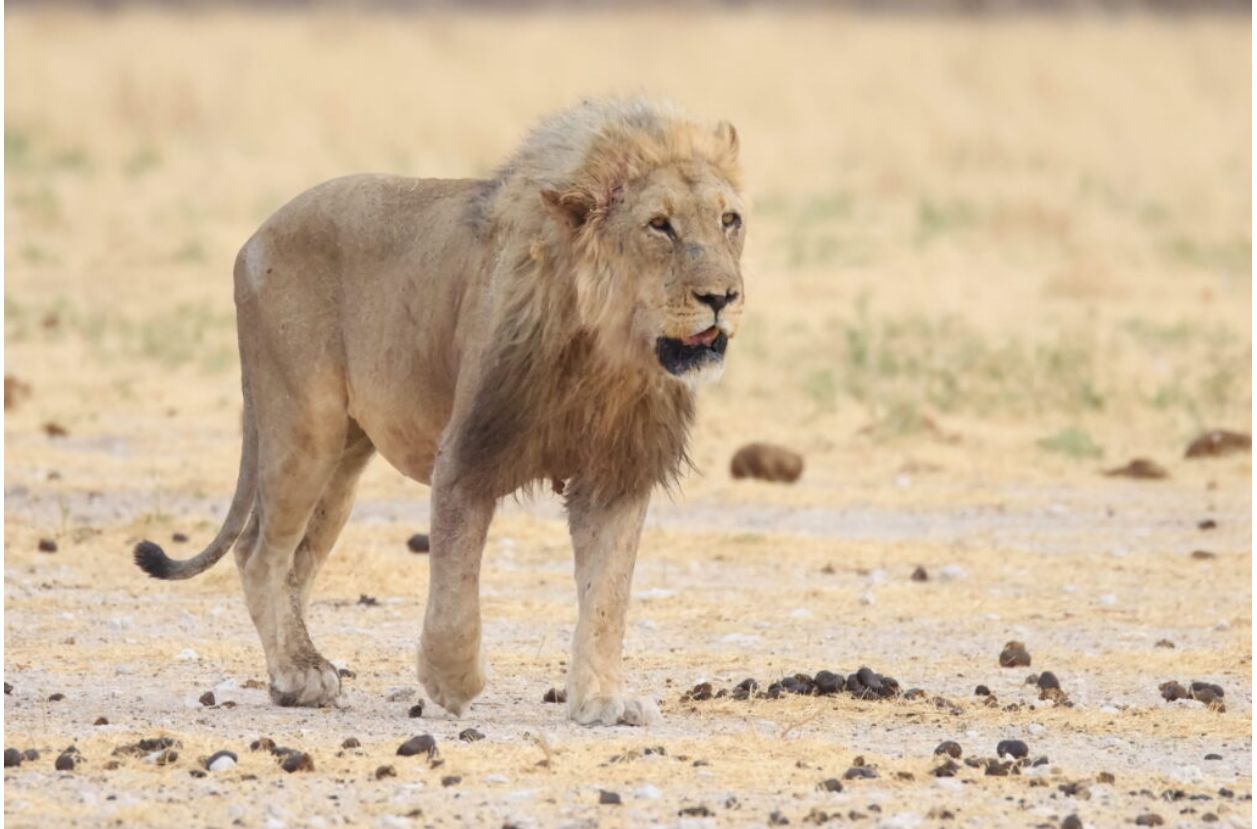
Lion (image by Janos Olah)