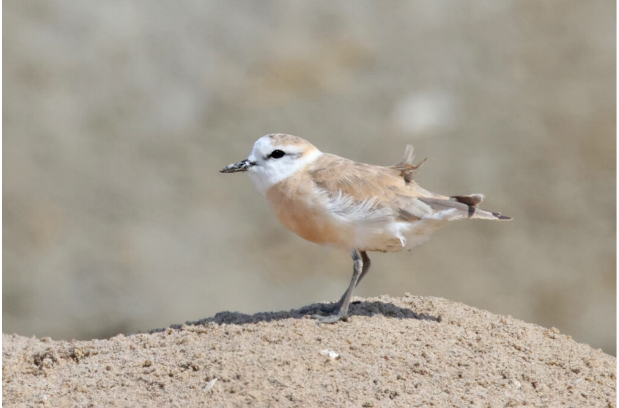
White-fronted Plover