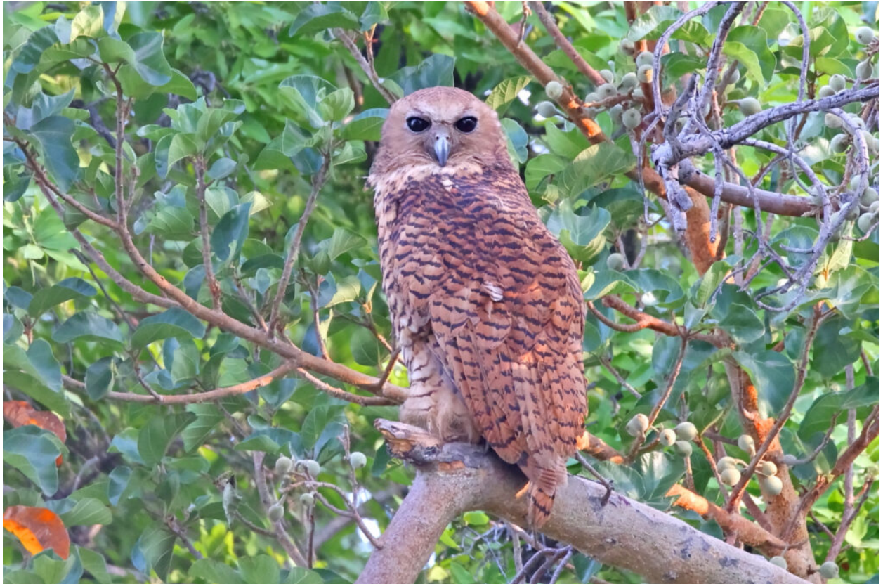
Pel's Fishing Owl