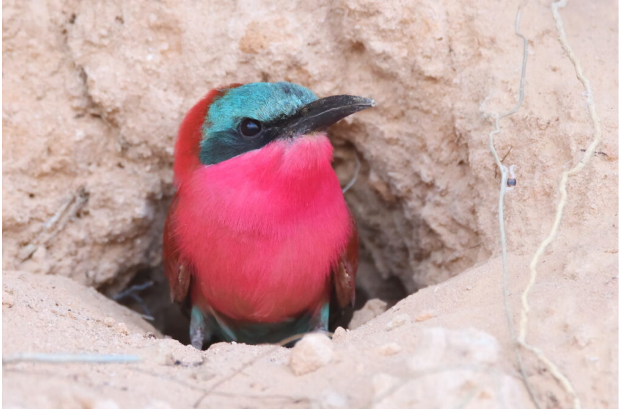
Southern Carmine Bee-eater