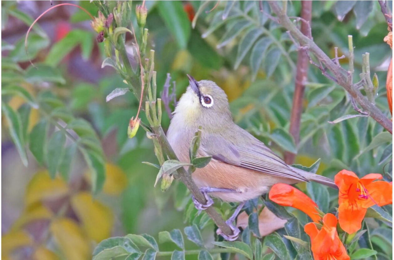
Orange River White-eye