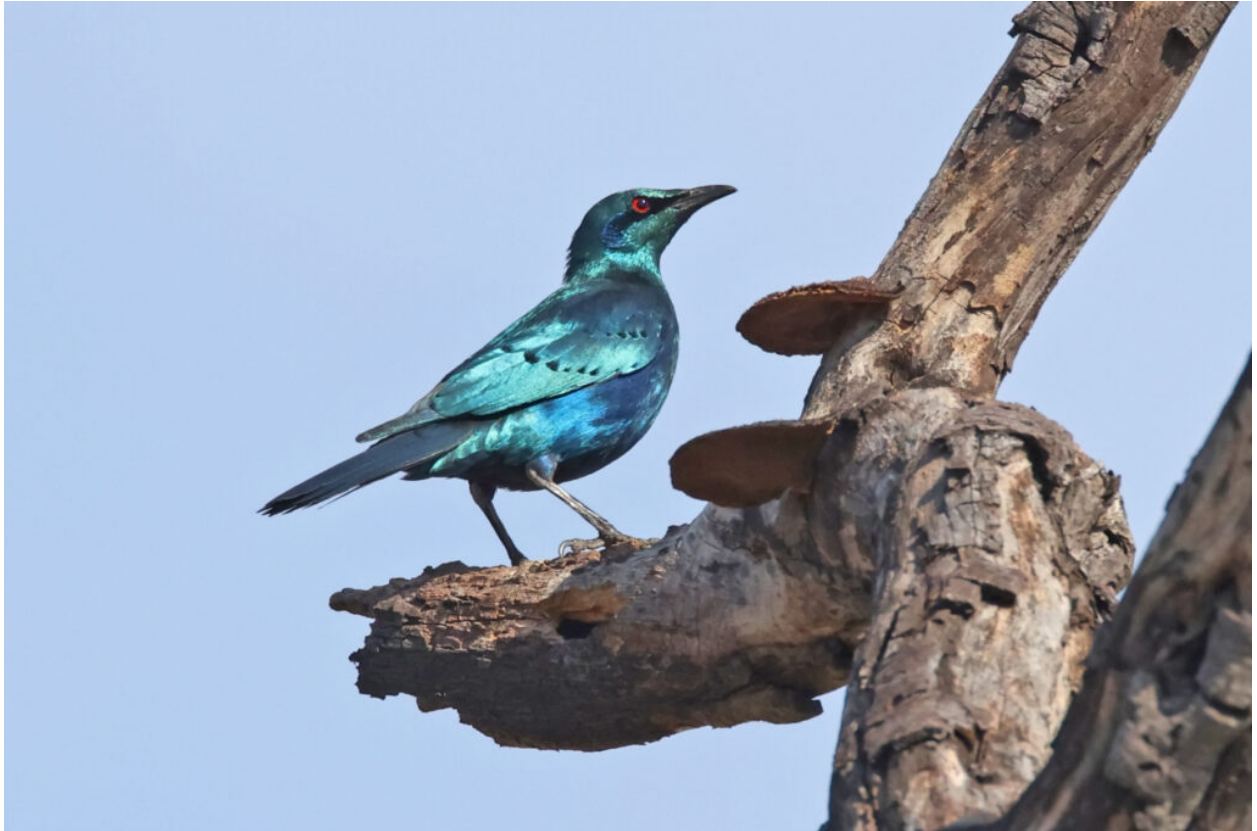
Sharp-tailed Starling