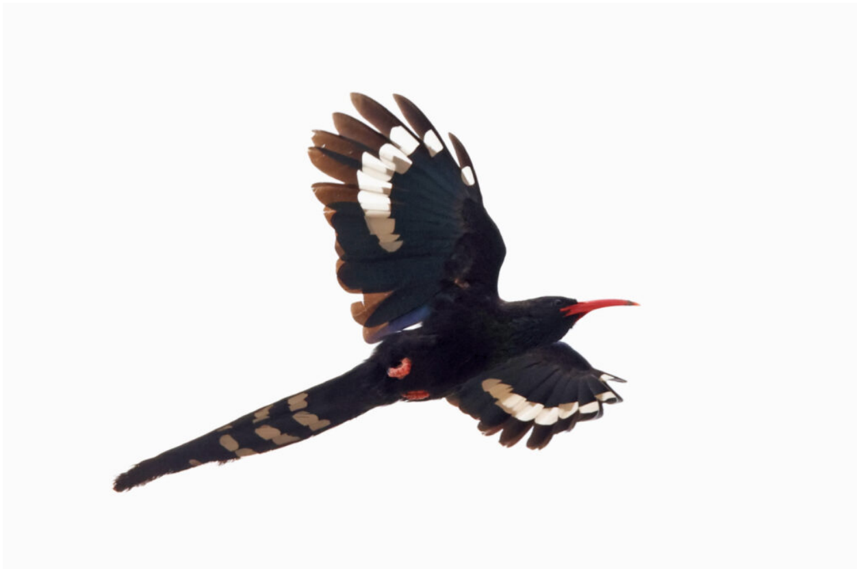
Violet Woodhoopoe