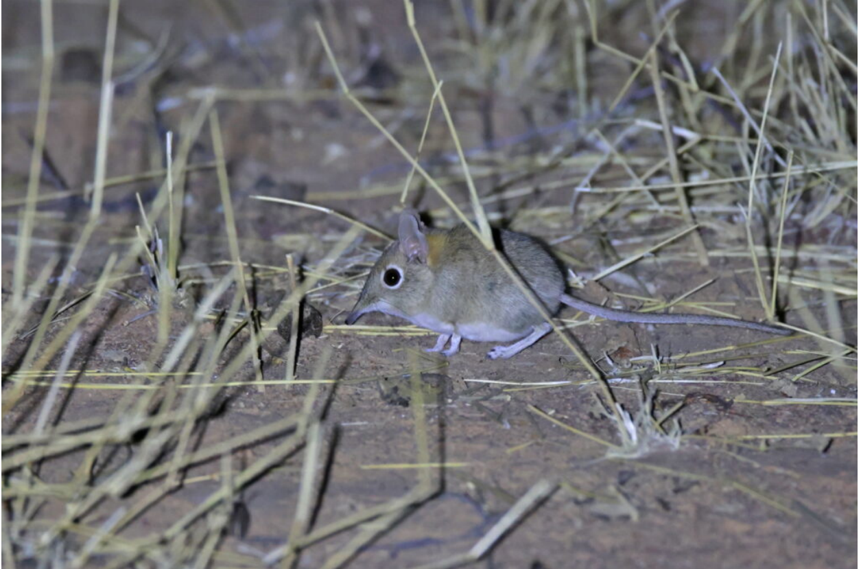
Bushveld Sengi