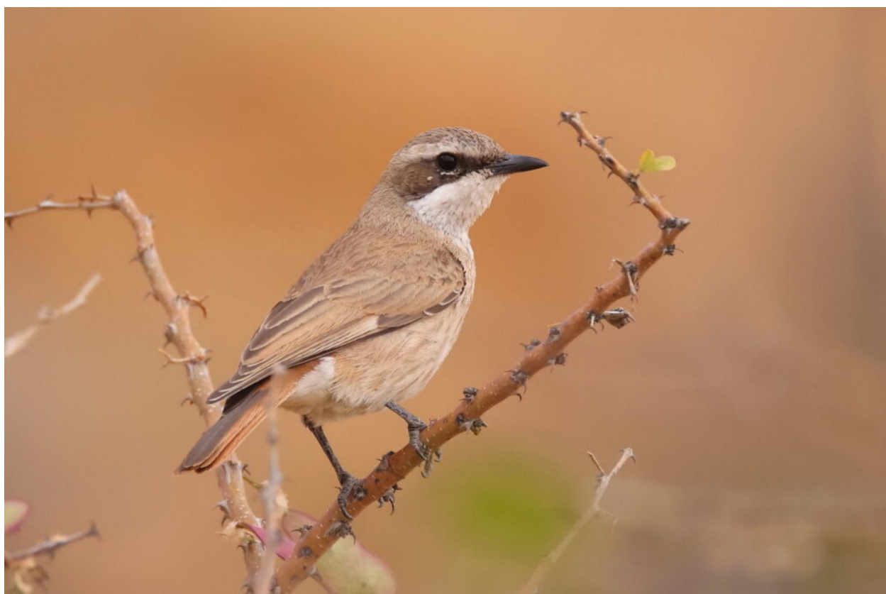
Herero Chat