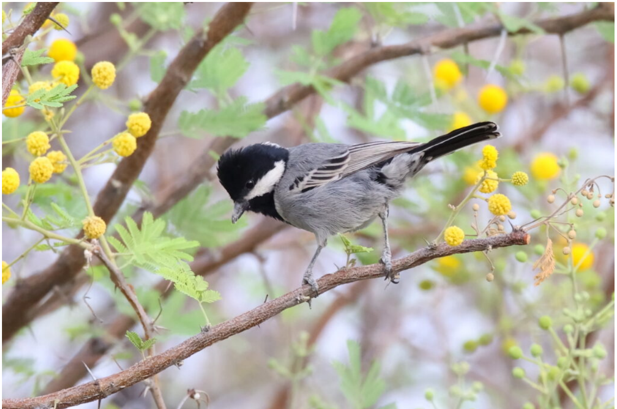
Ashy Tit