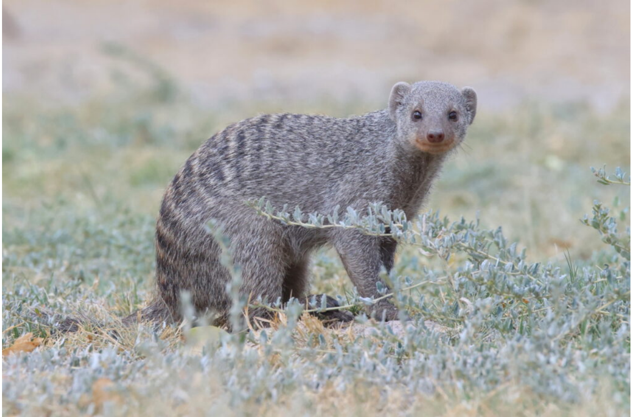
Banded Mongoose