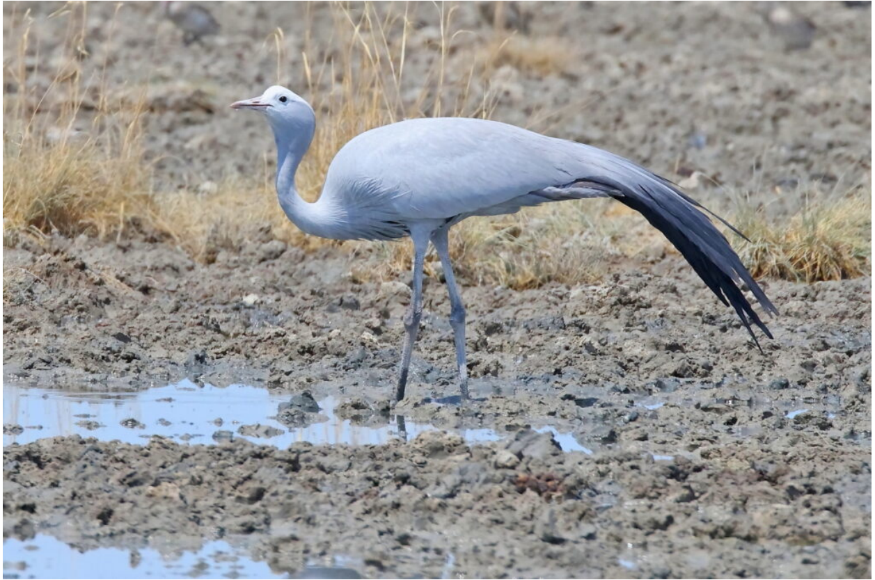
Blue Crane