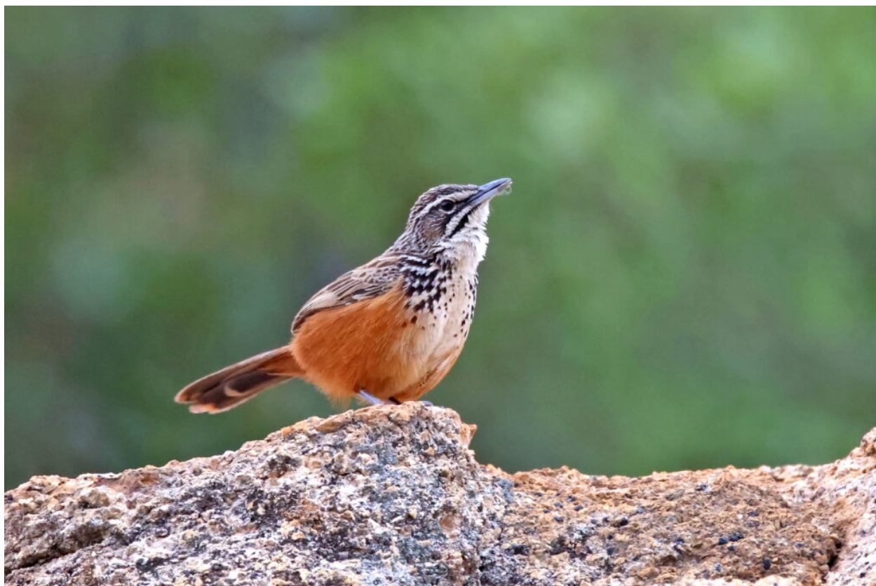
Rockrunner