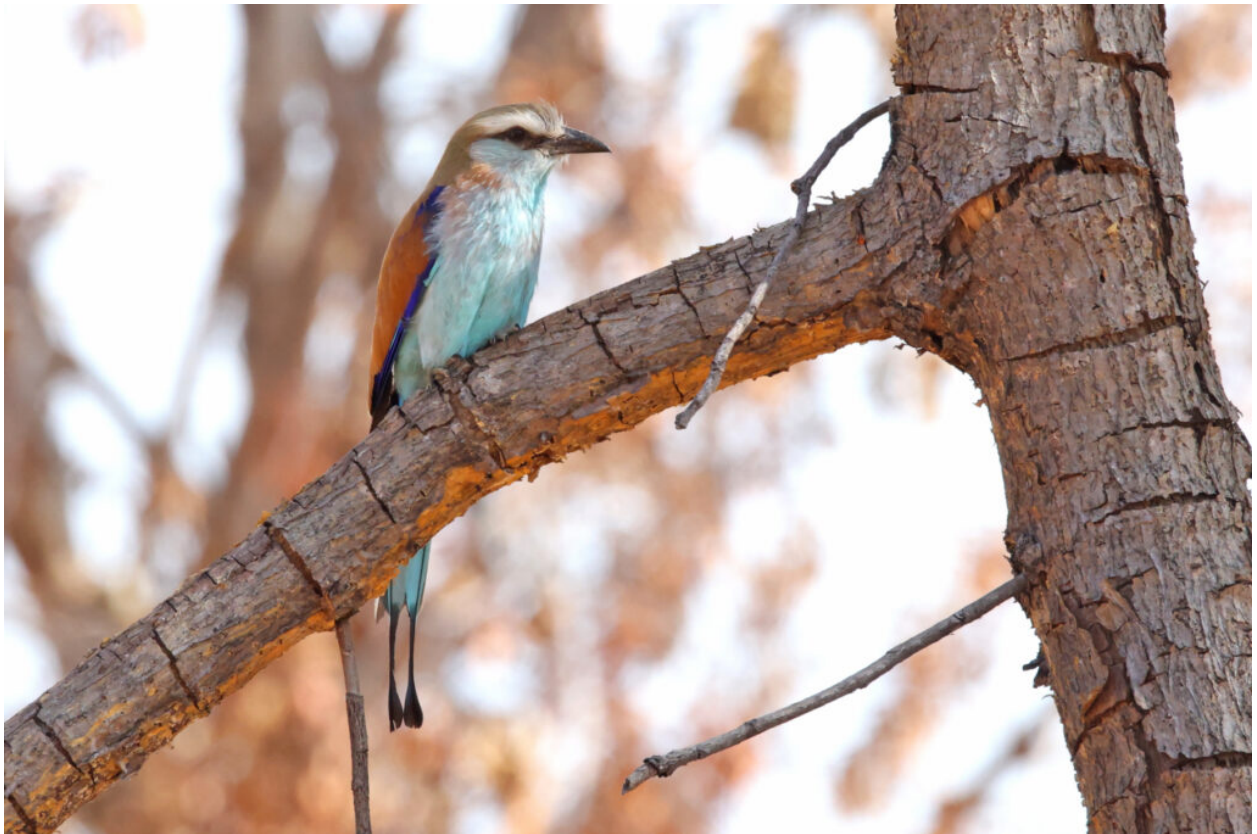
Racket-tailed Roller