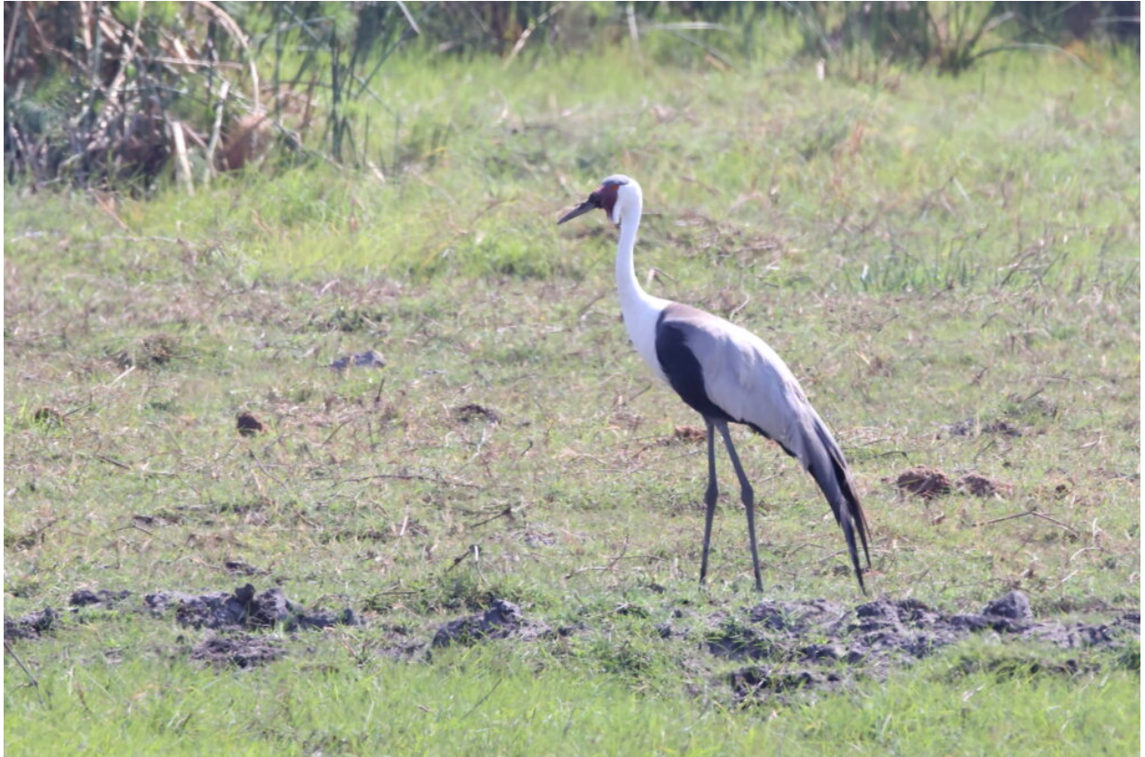
Wattled Crane