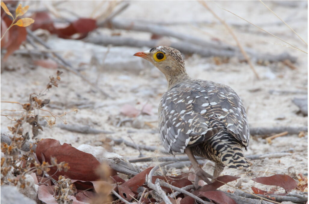
Double-banded Sandgrouse