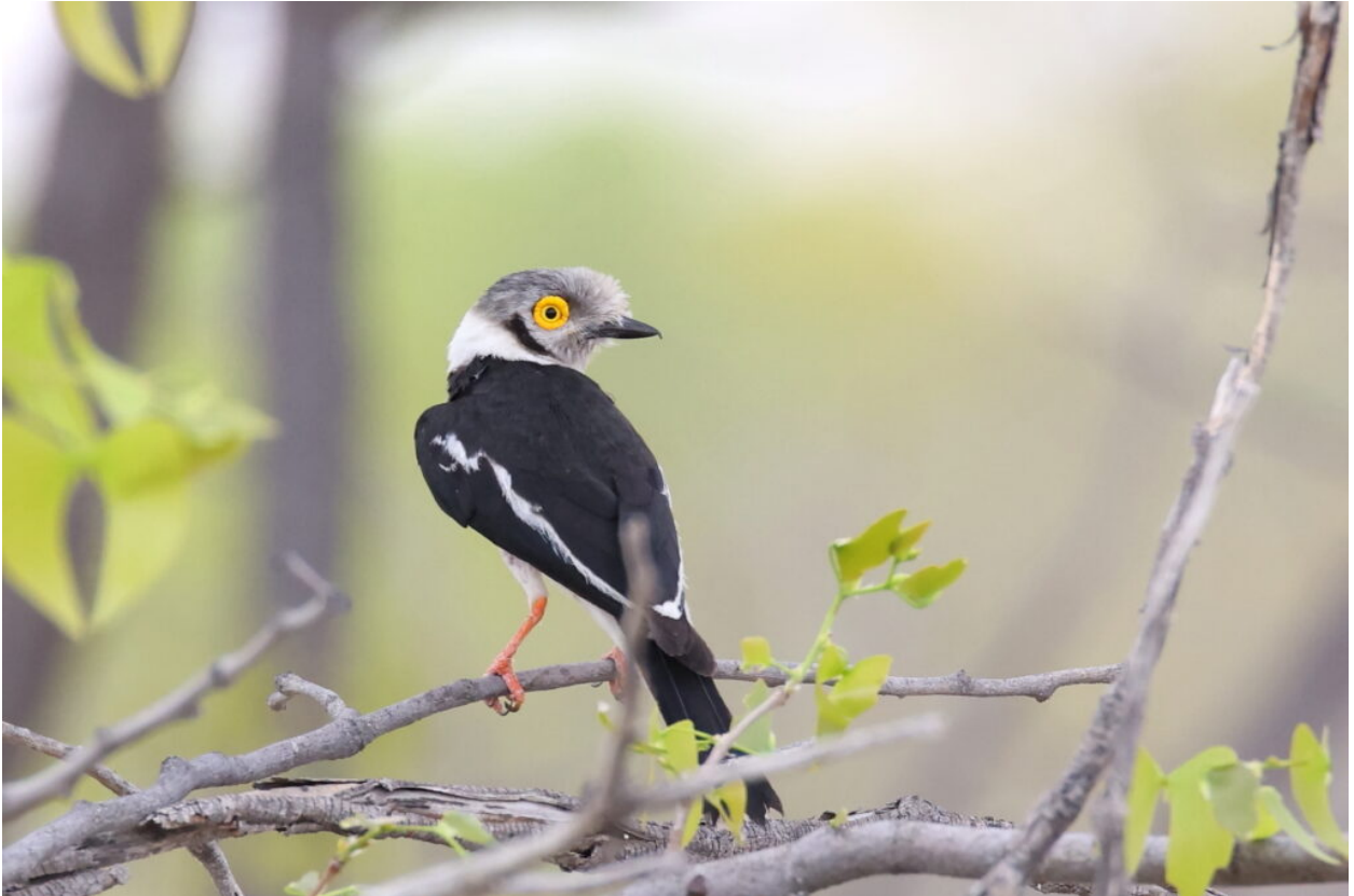
White-crested Helmetshrike