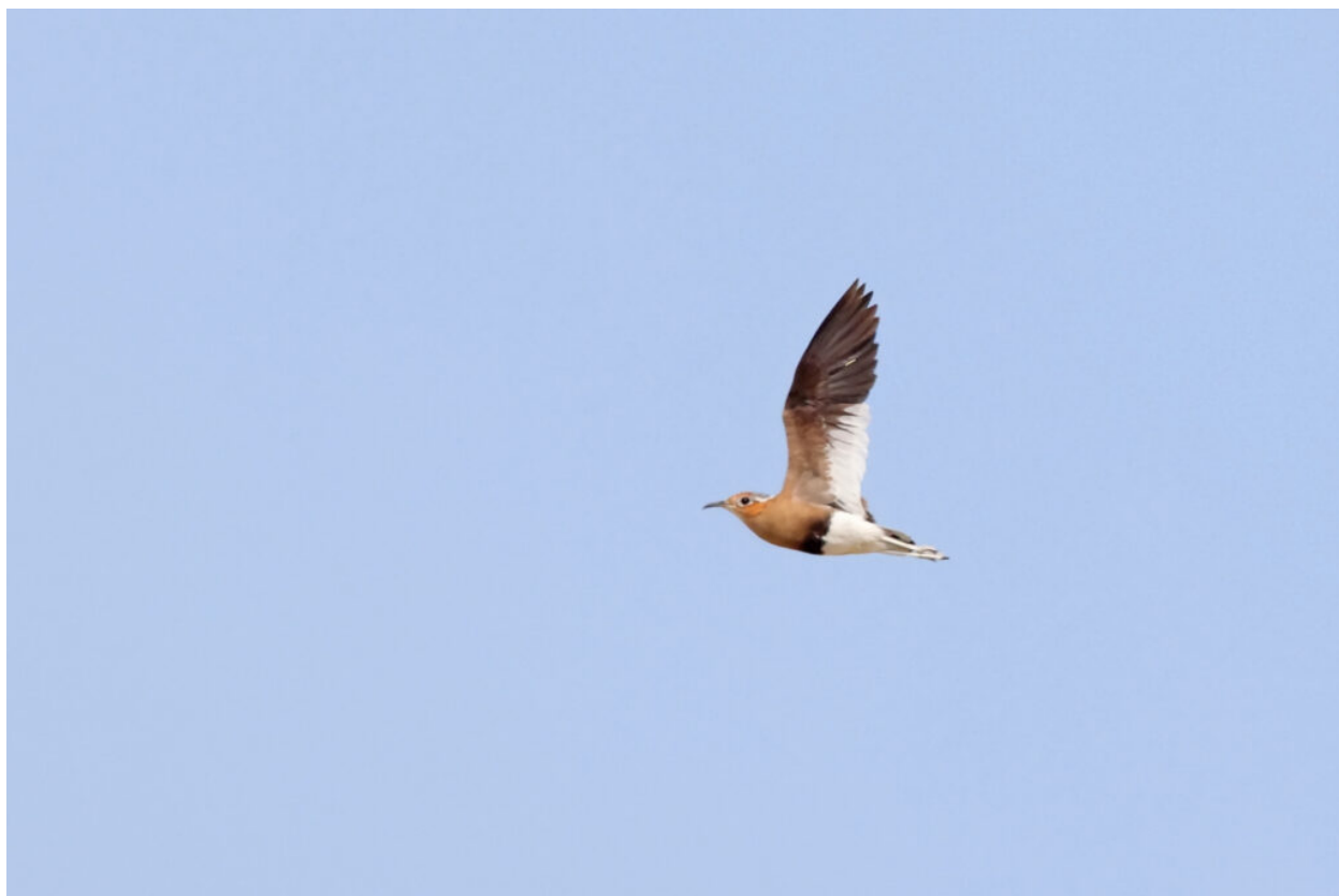
Burchell's Courser