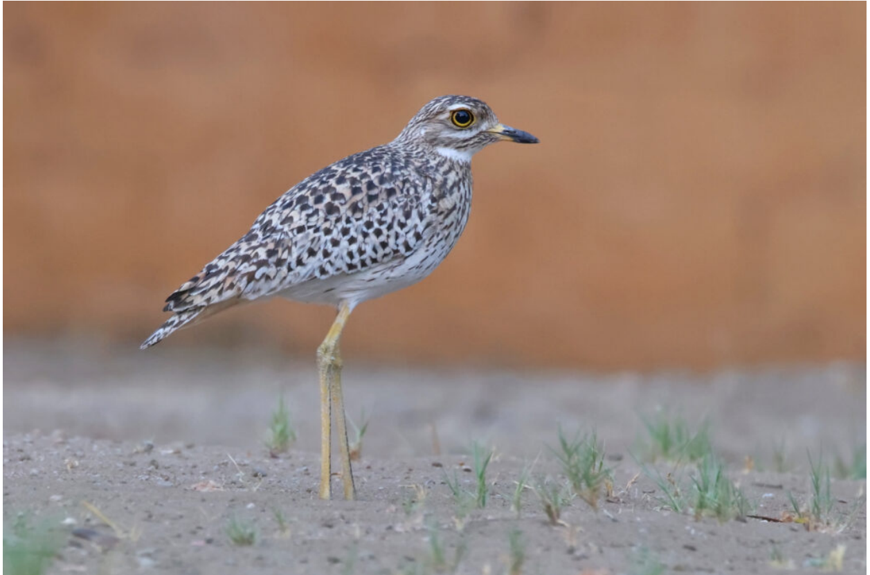
Spotted Thick-knee