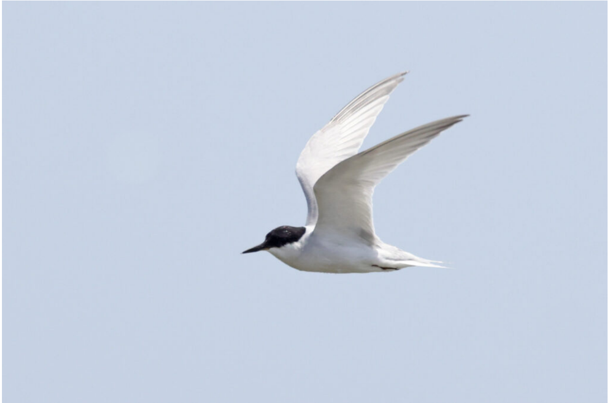
Damara Tern