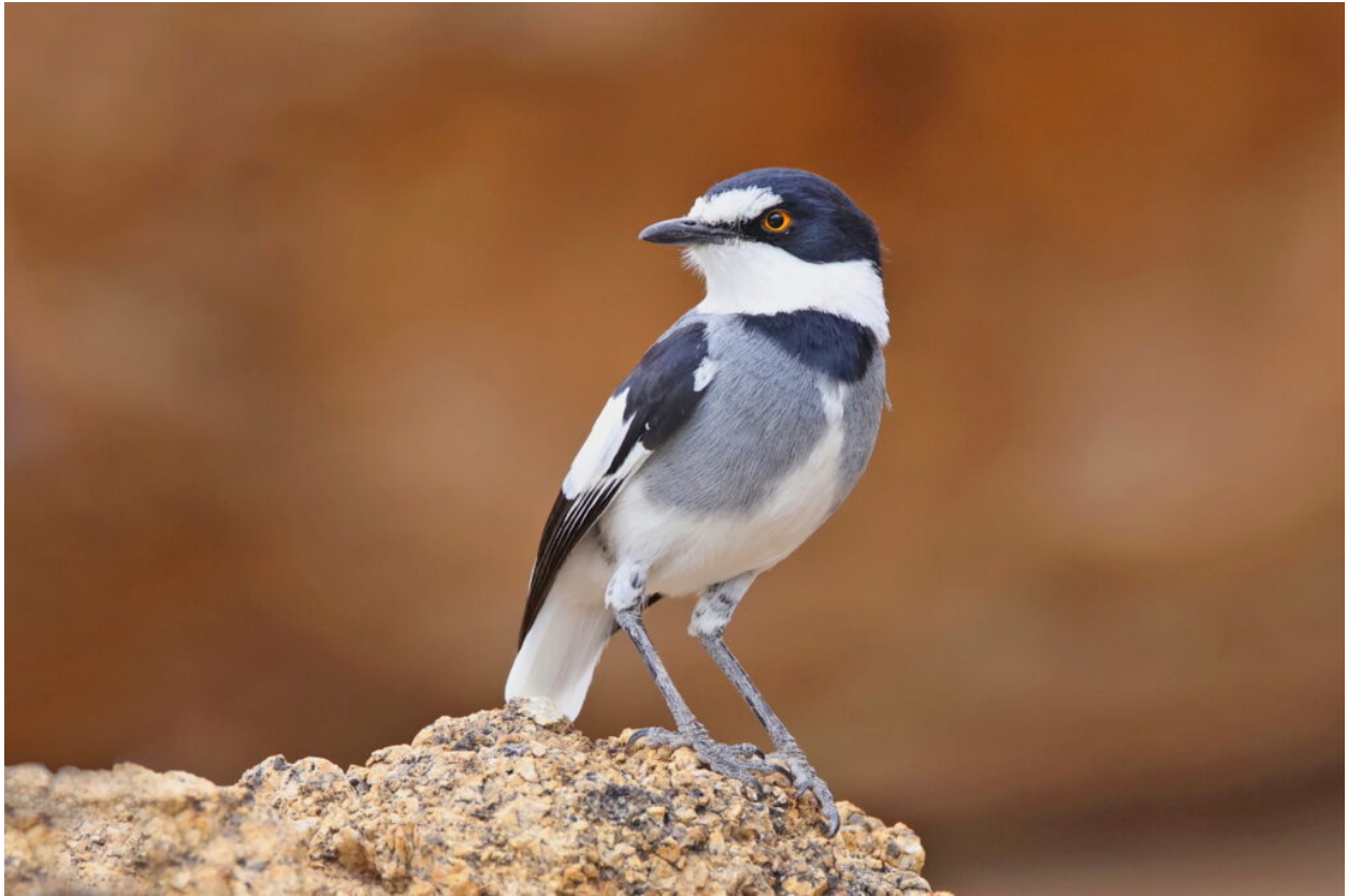
White-tailed Shrike

Black-tailed Thallomys Thallomys nigricauda One was seen at Okaukuejo in Etosha NP.