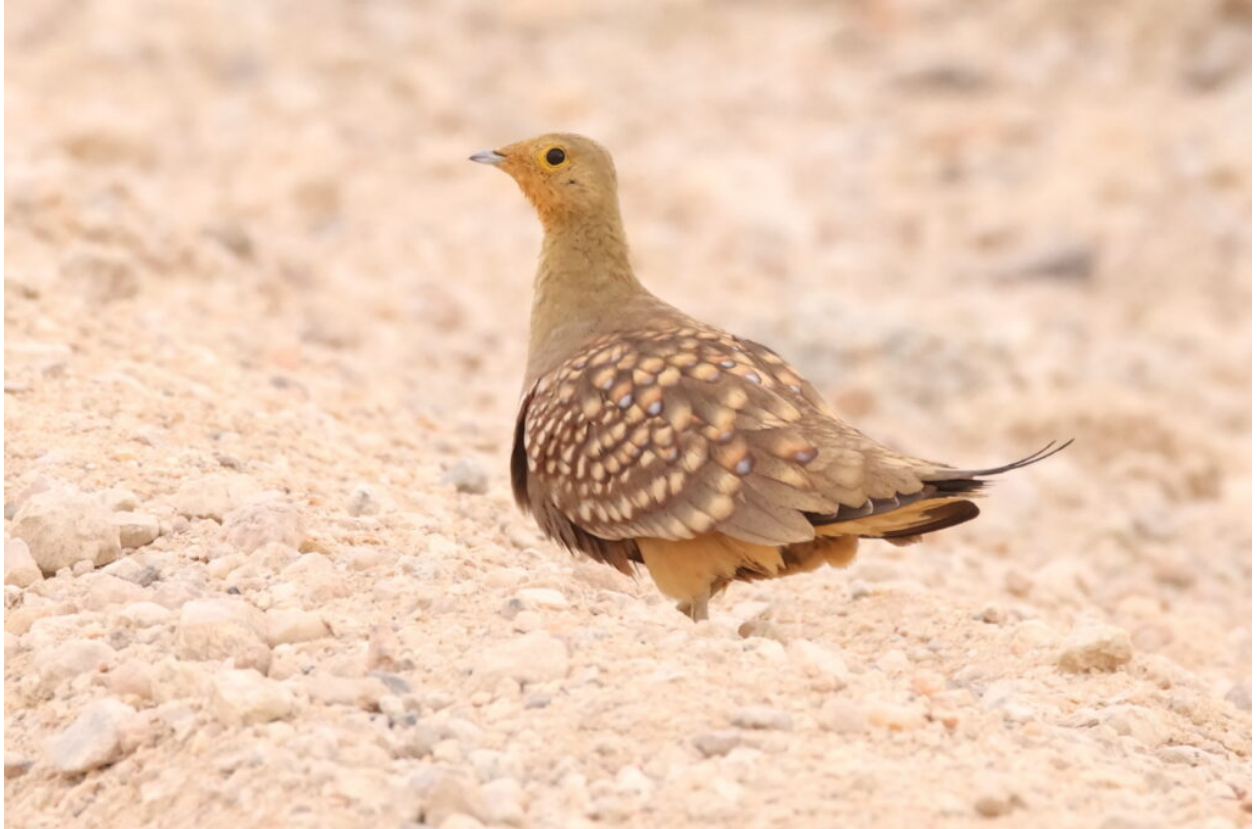
Namaqua Sandgrouse