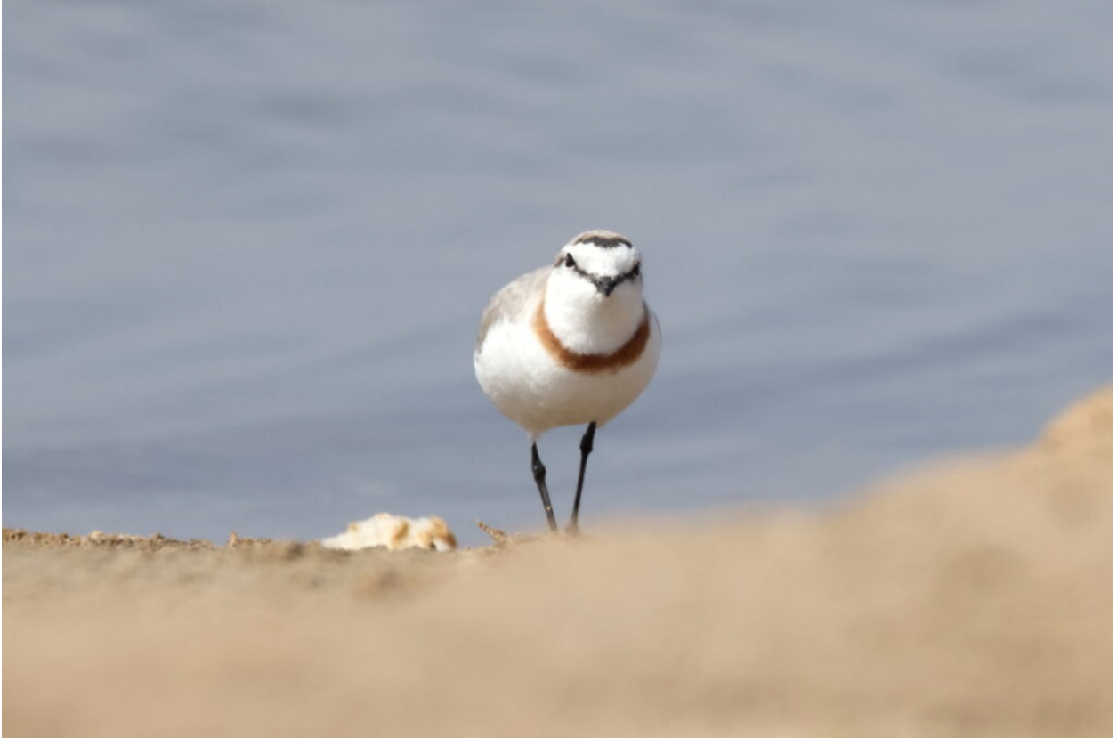
Chestnut-banded Plover