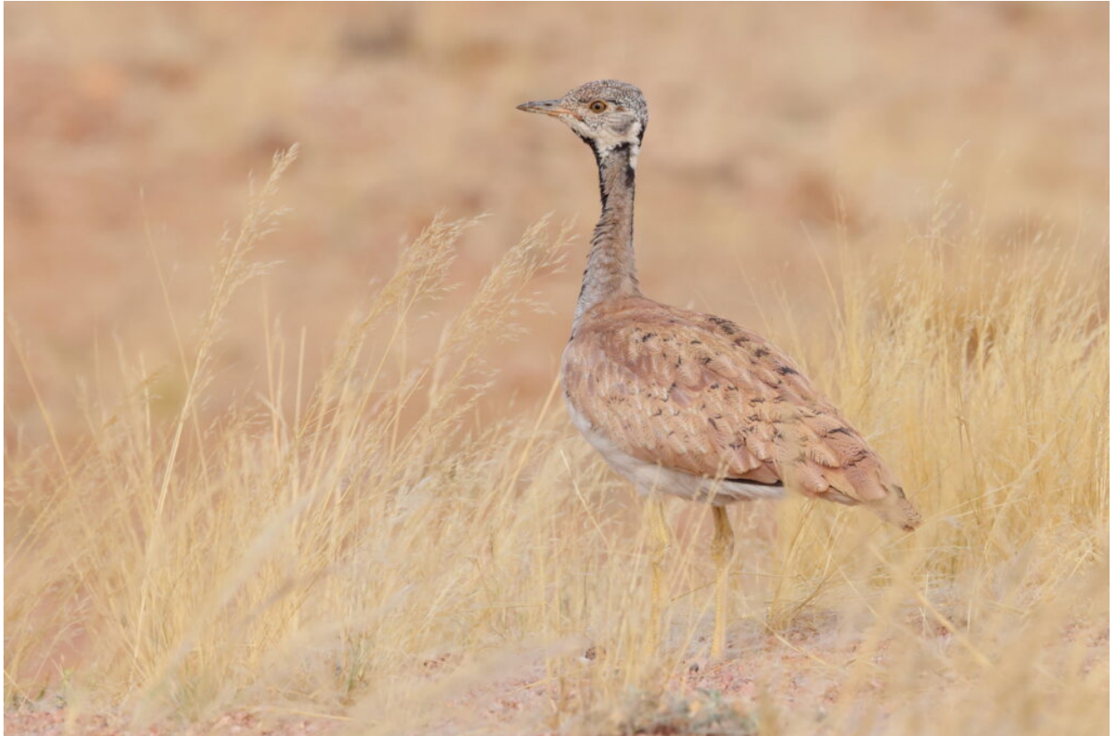
Rüppel's Korhaan