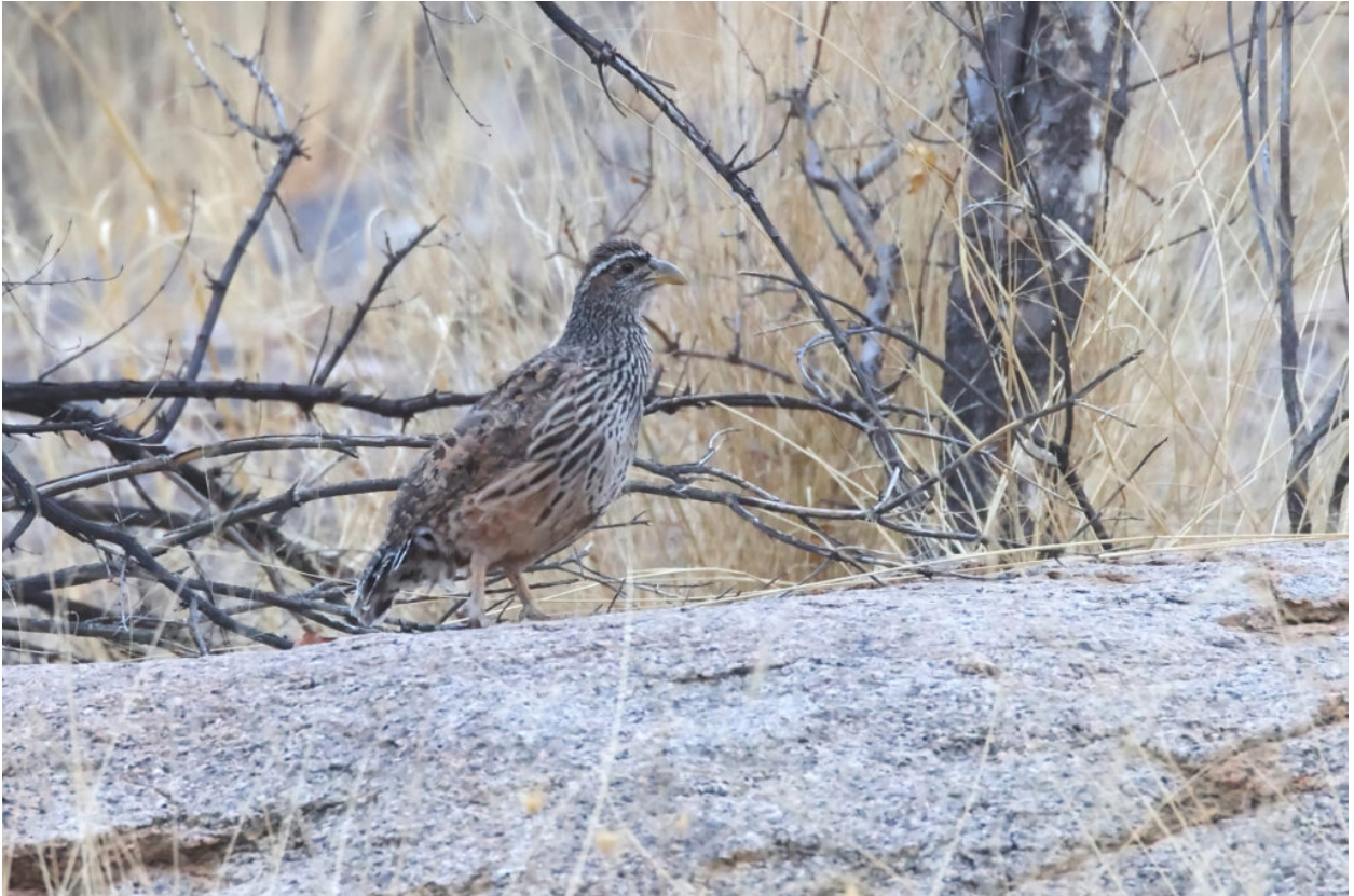
Hartlaub's Francolin