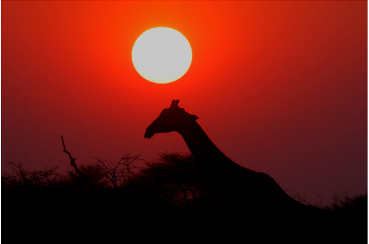
Etosha NP sunset