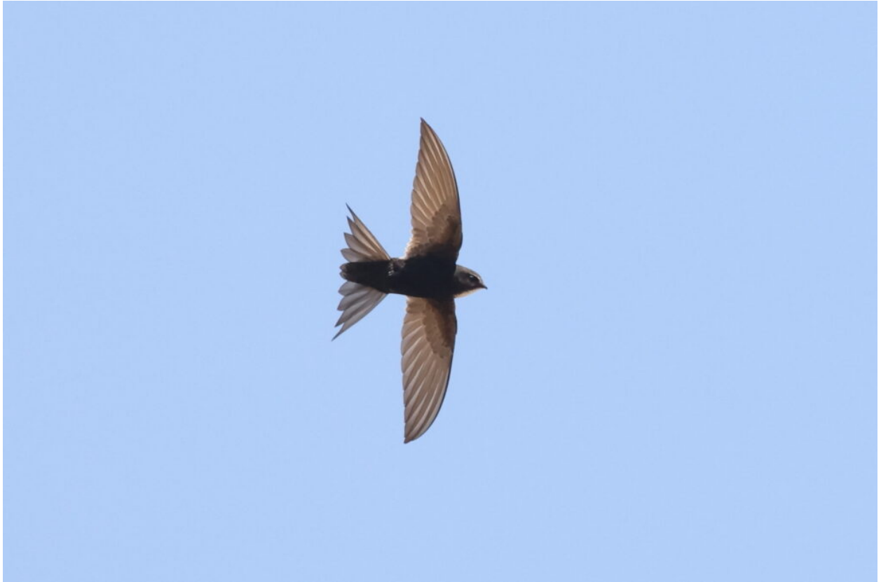
Fork-tailed Swift