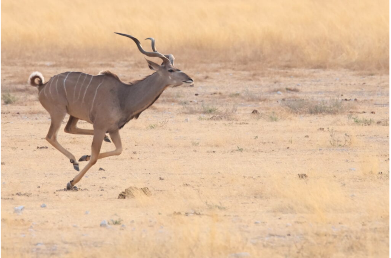
Greater Kudu