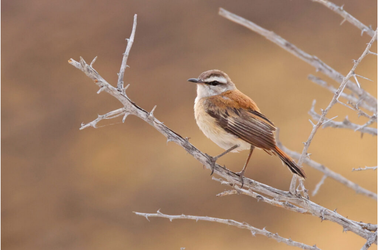
Kalahari Scrub Robin