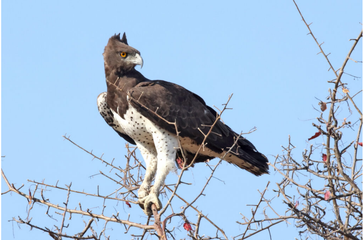
Martial Eagle