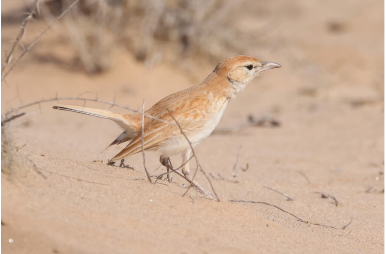
Dune Lark