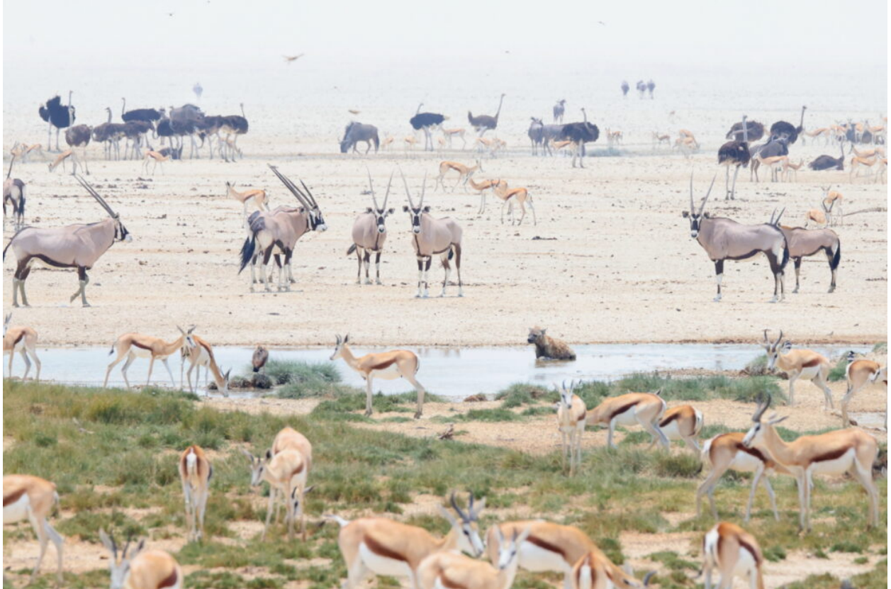
Etosha NP waterhole