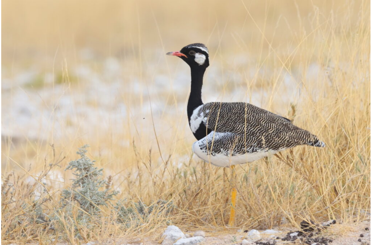
Northern Black Korhaan