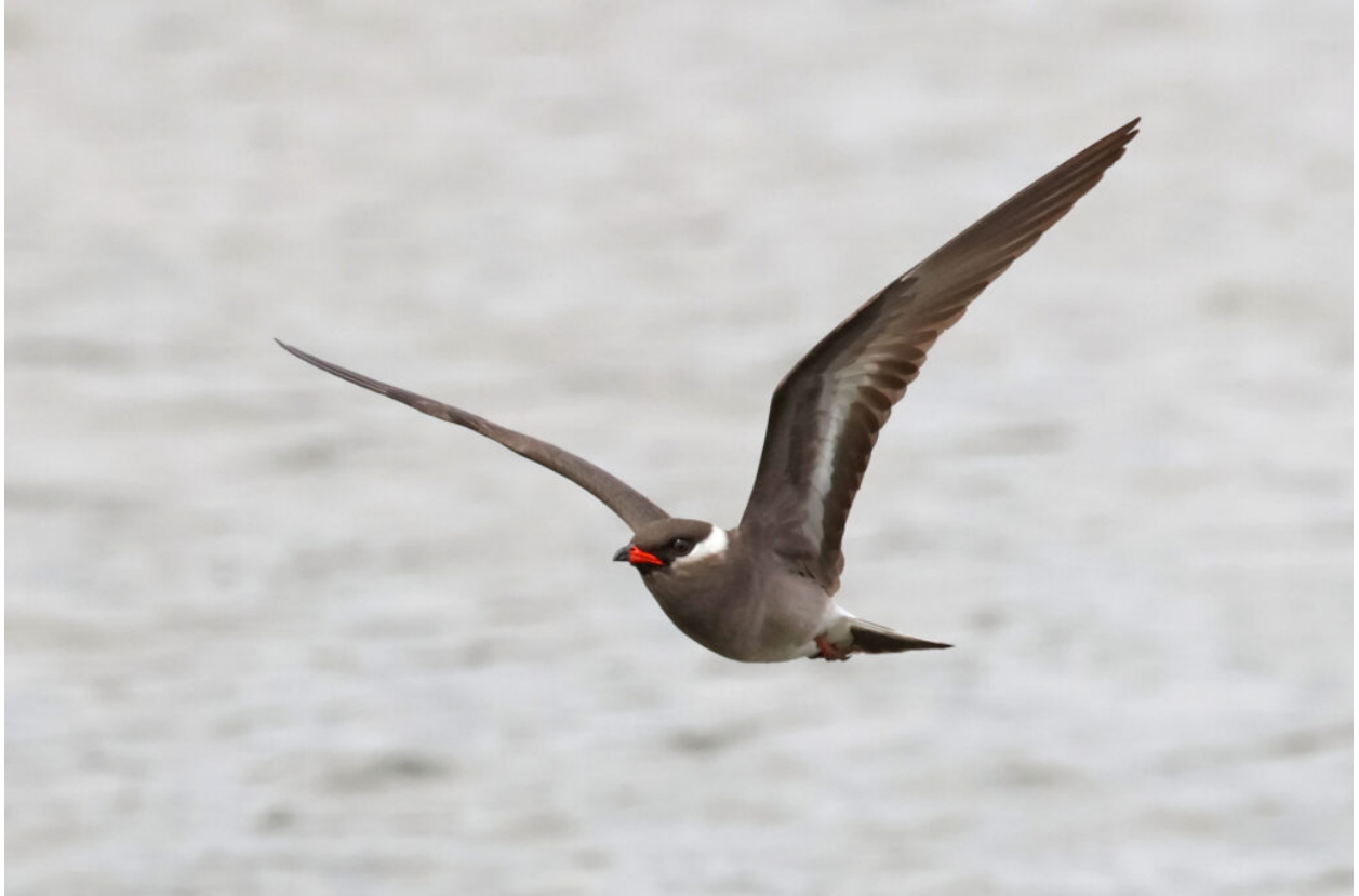
Rock Pratincole