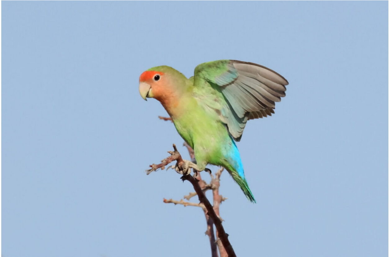
Rosy-faced Lovebird