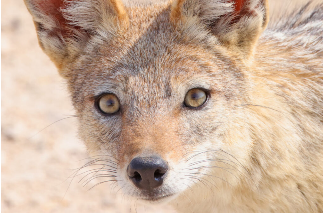
Black-backed Jackal