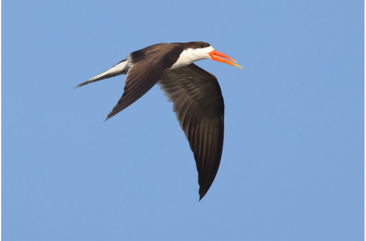
African Skimmer