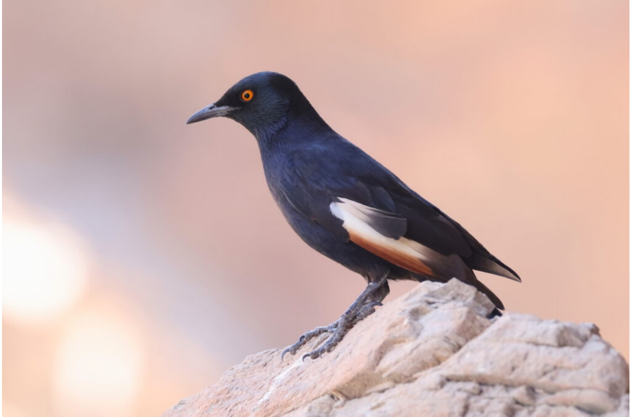
Pale-winged Starling