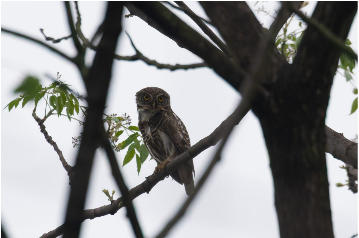
Asian Barred Owlet