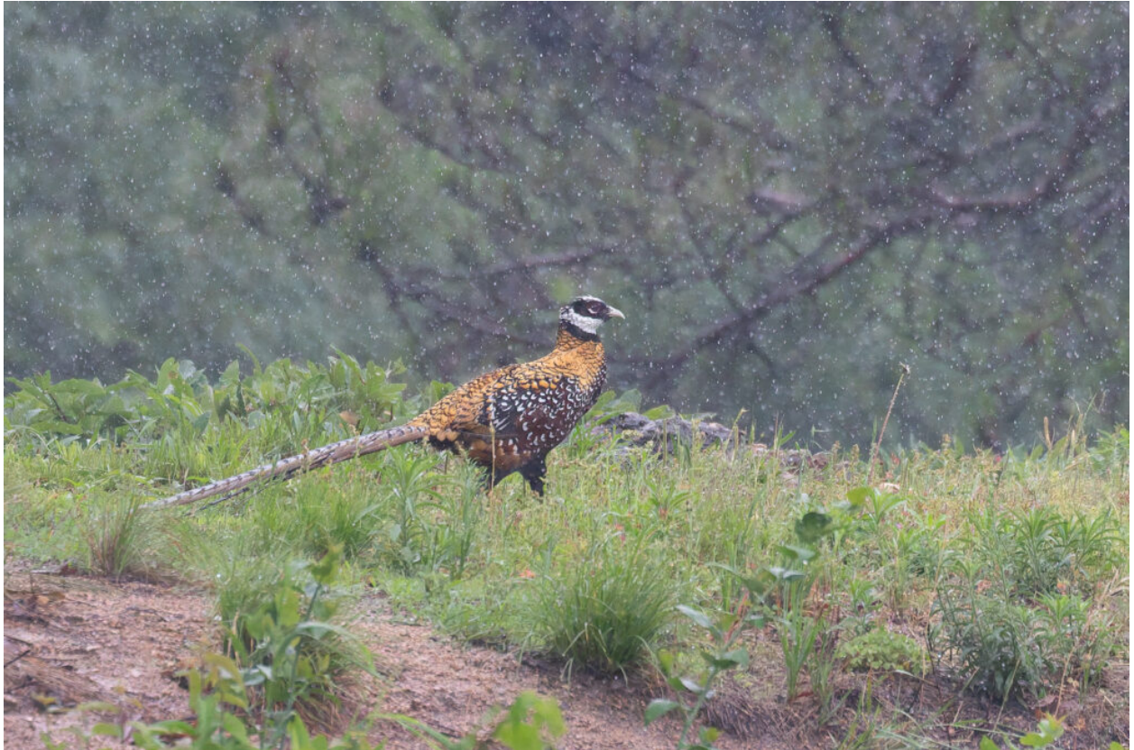
Reeves's Pheasant