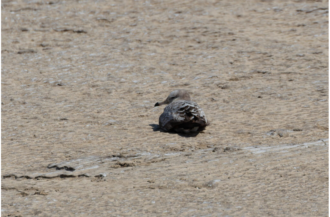
Mongolian Gull (image by Diedert Koppenol)