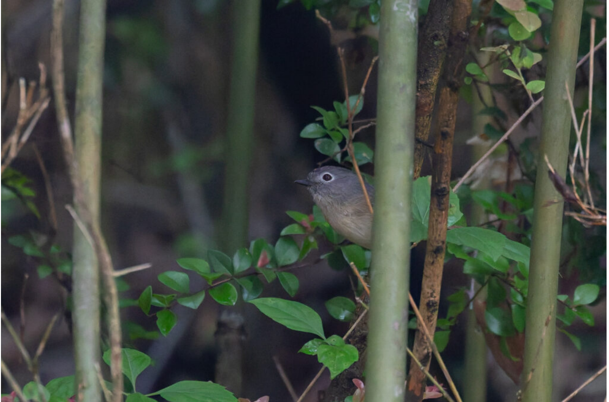
Huet's Fulvetta (image by Diedert Koppenol)