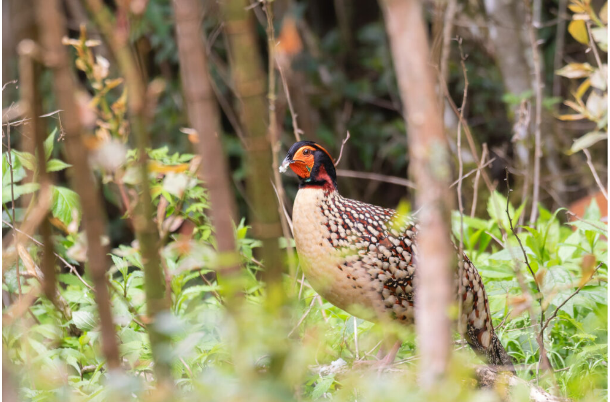
male Cabot's Tragopan