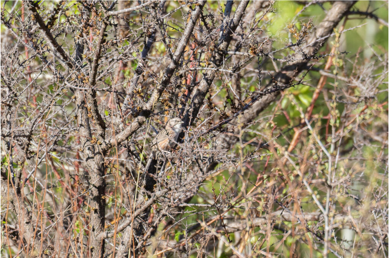
Beijing Babbler