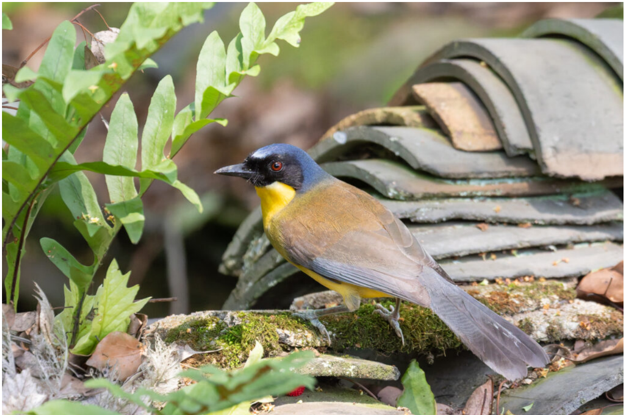
Blue-crowned Laughingthrush