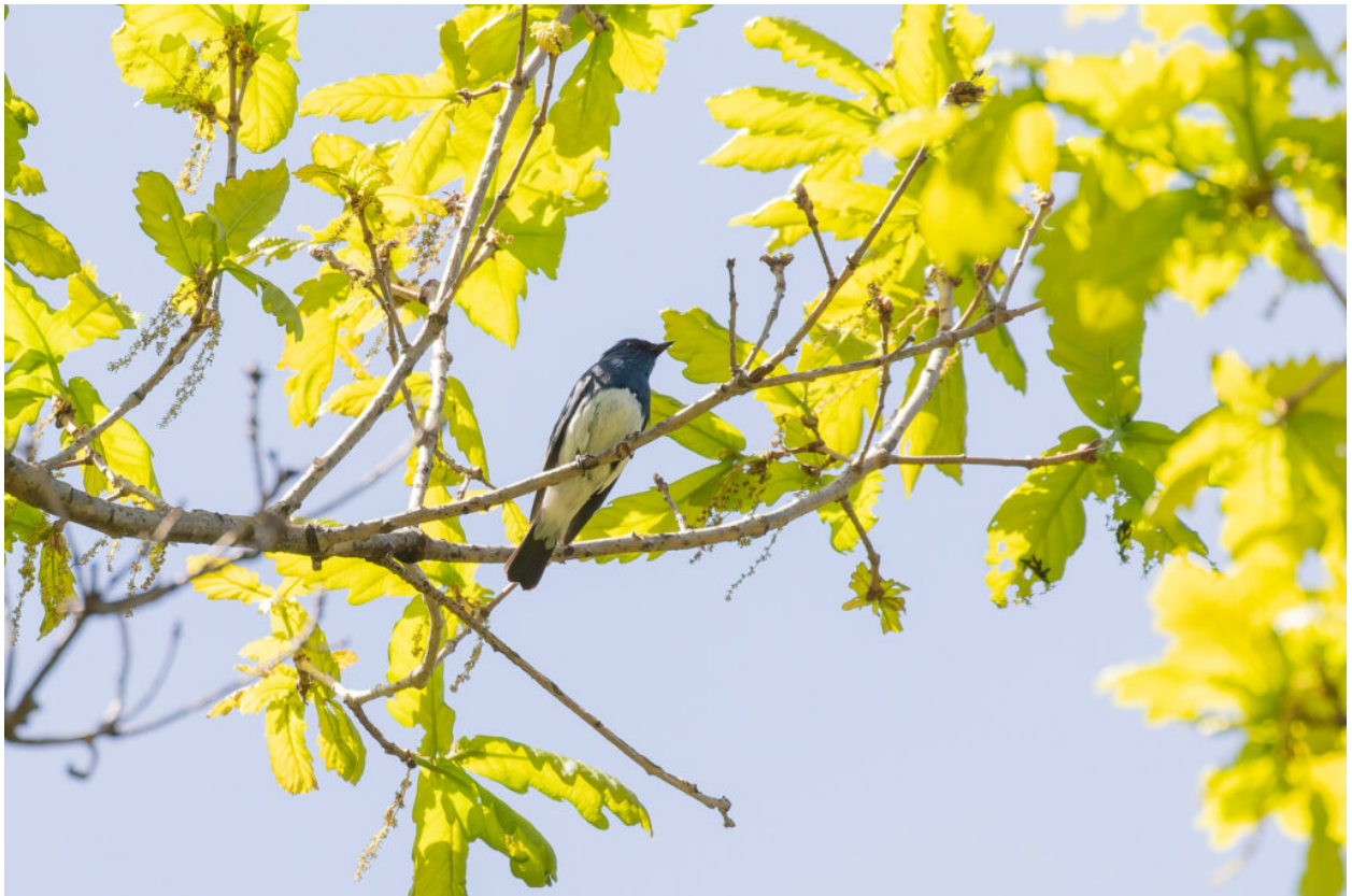
Zappey's Flycatcher