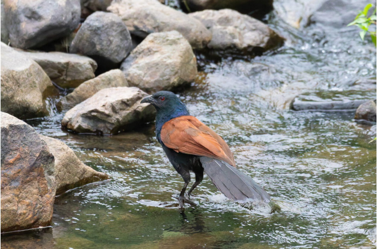
Greater Coucal