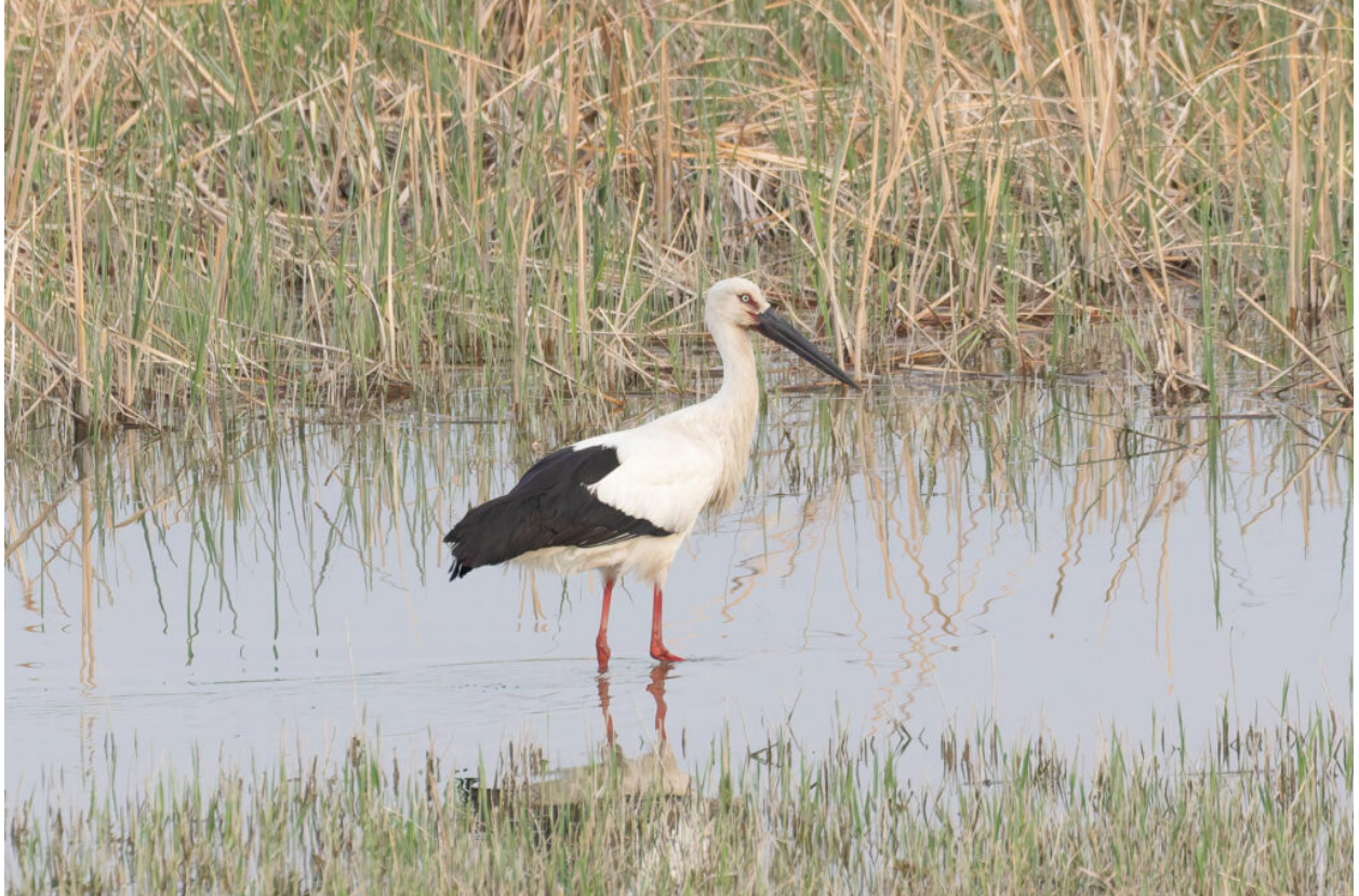
the endangered Oriental Stork