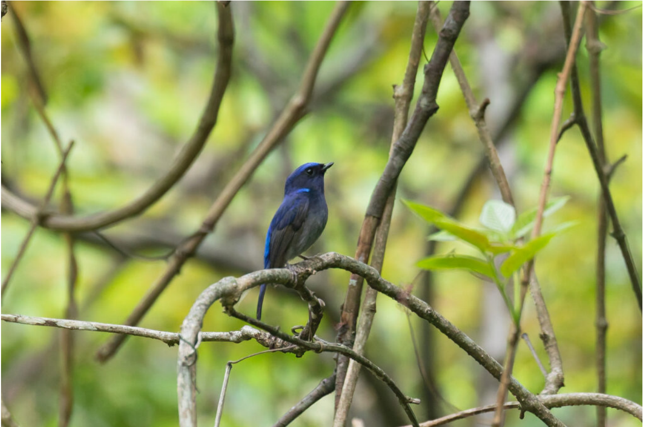
Small Niltava