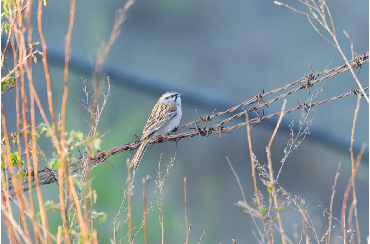
Godlewski's Bunting