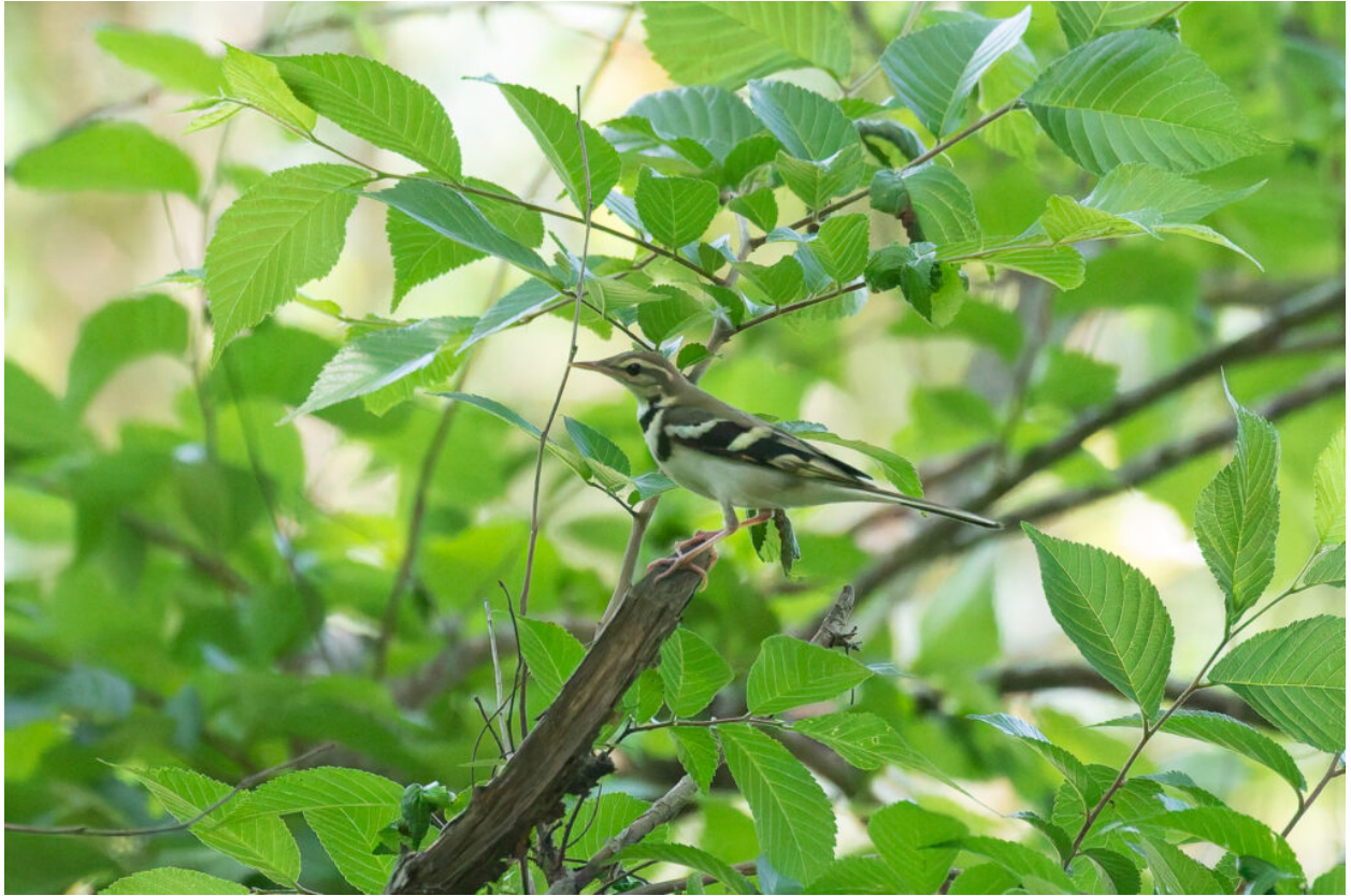
Forest Wagtail