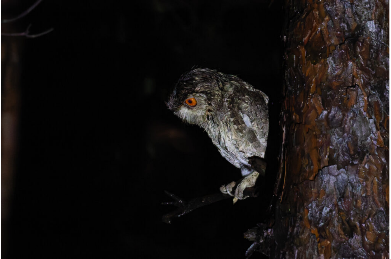
Japanese Scops Owl