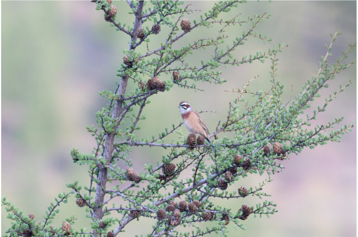
Meadow Bunting (image by Diedert Koppenol)