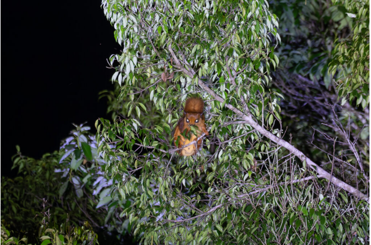
Red Giant Flying Squirrel