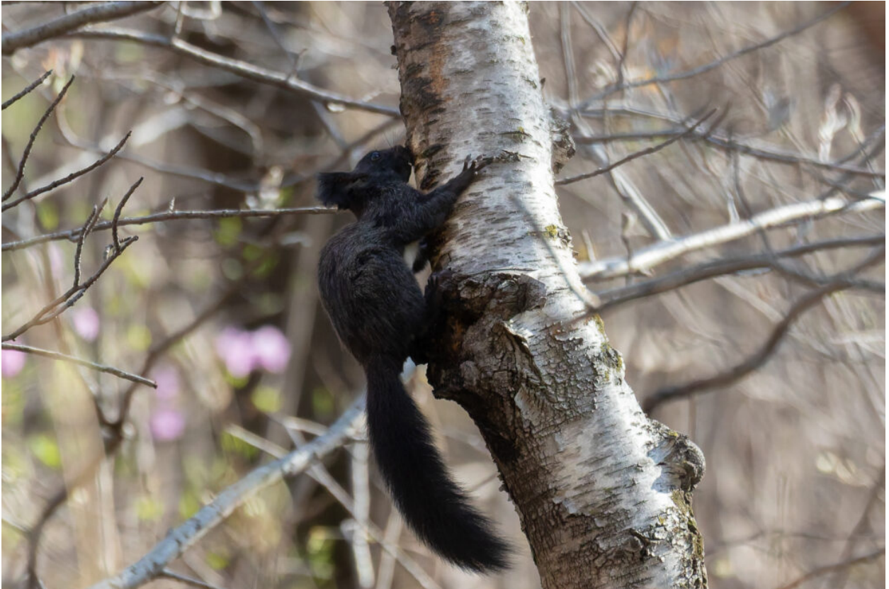
black morph of Red Squirrel