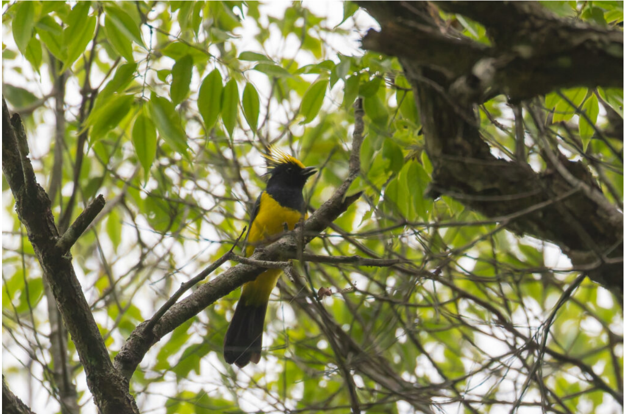
Sultan Tit