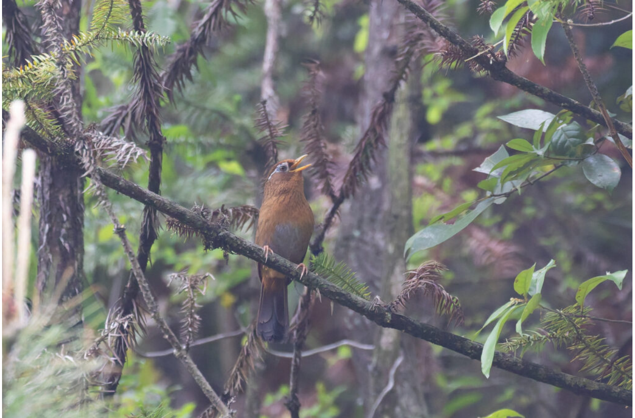
Chinese Hwamei