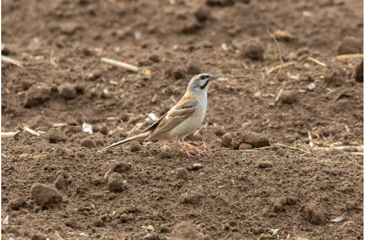
Jankowski's Bunting