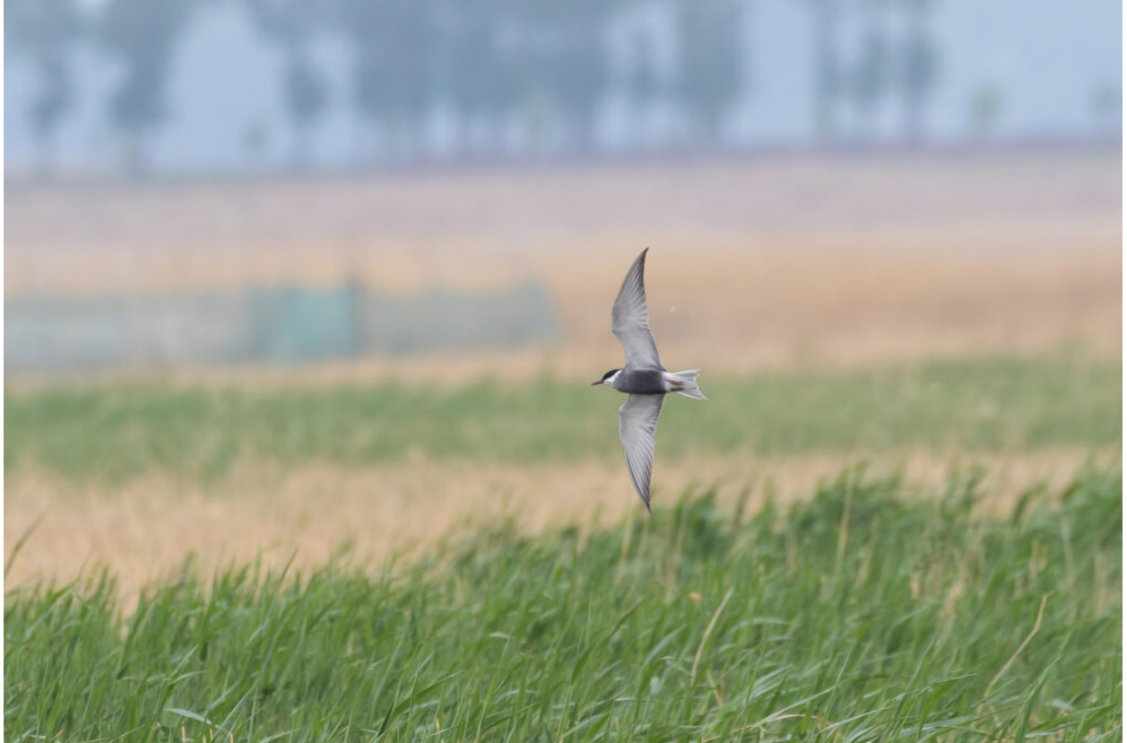
Whiskered Tern