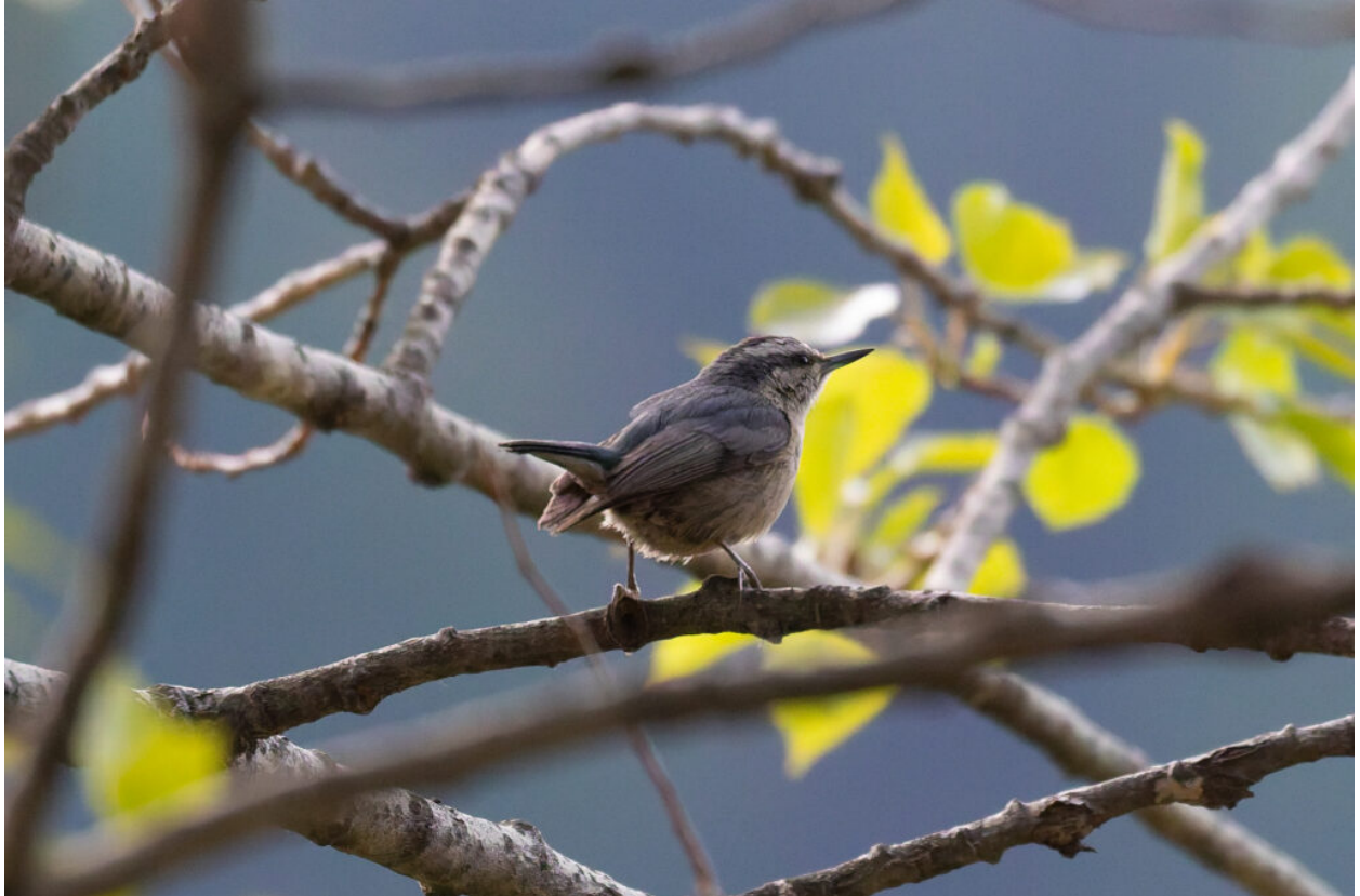
Chinese Nuthatch