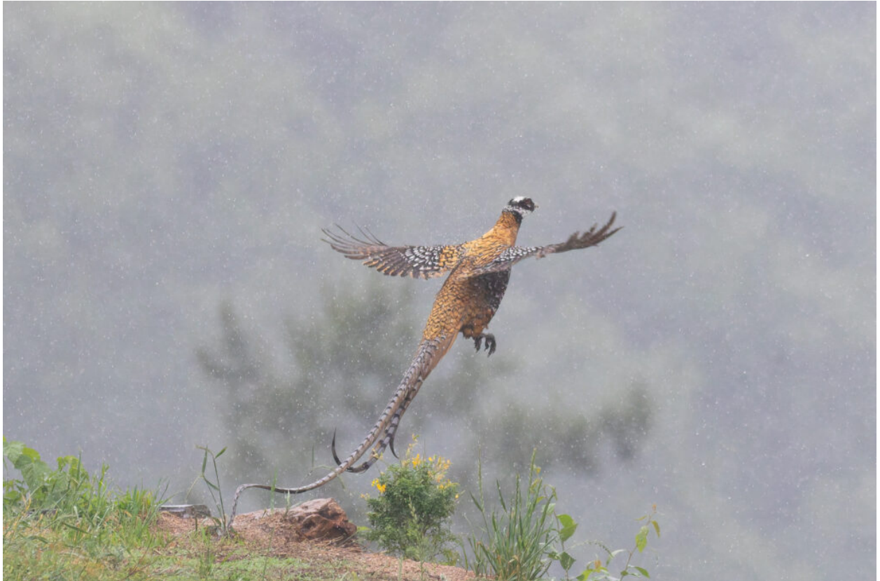
Reeves's Pheasant