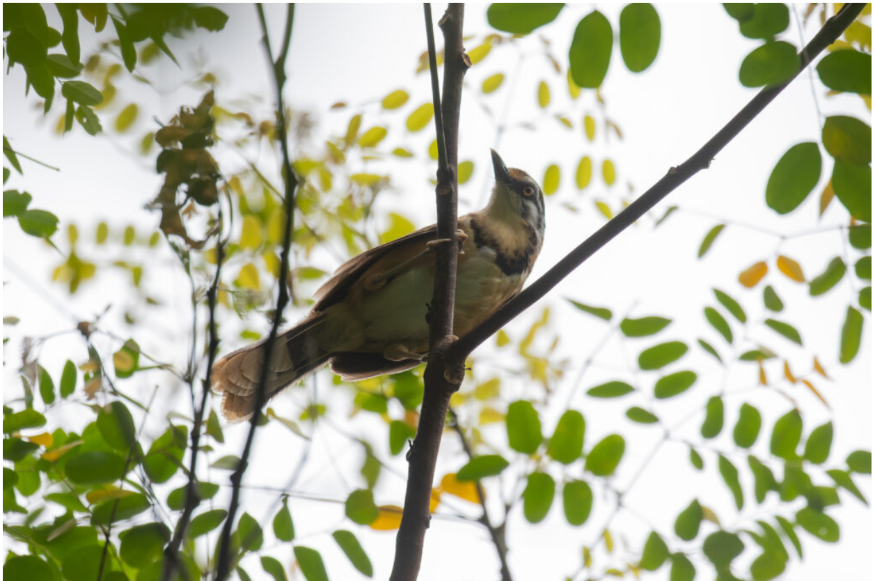
Lesser Necklaced Laughingthrush