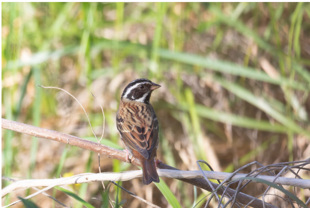
Tristram's Bunting