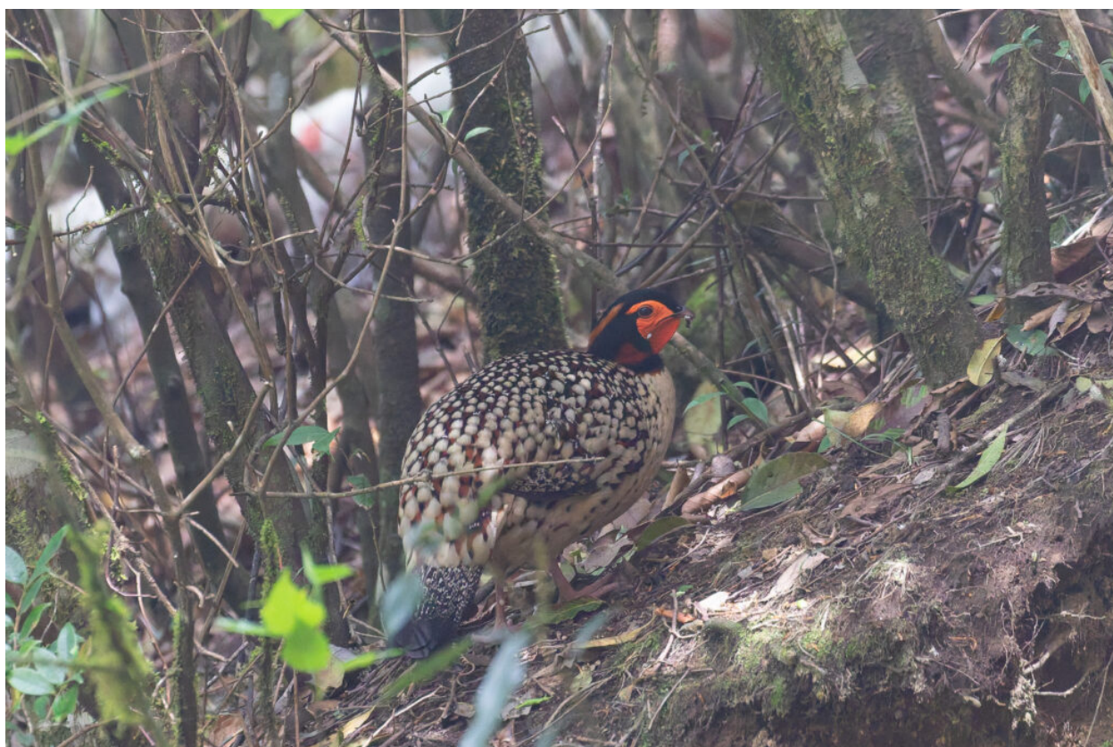
male Cabot's Tragopan