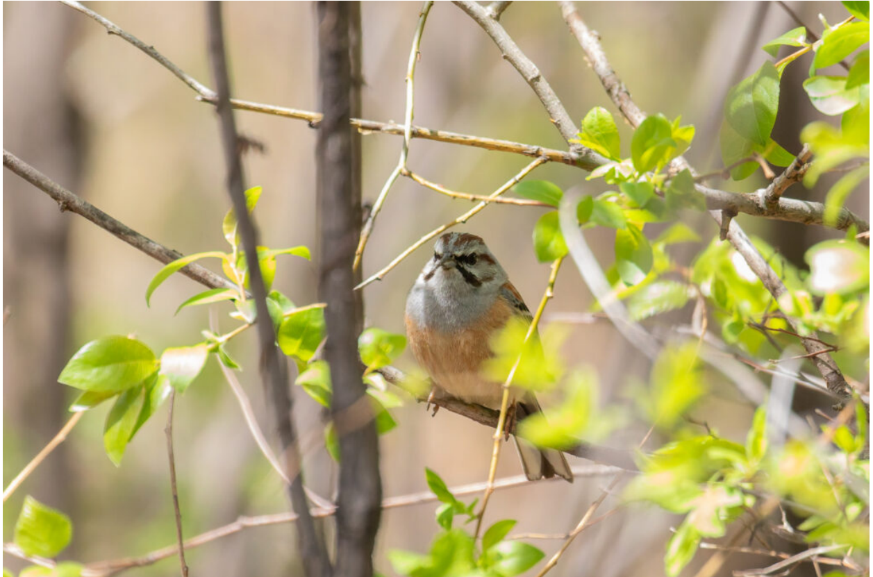
Godlewski's Bunting