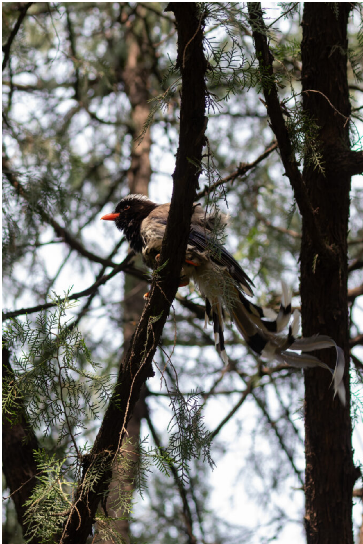
Red-billed Blue Magpie