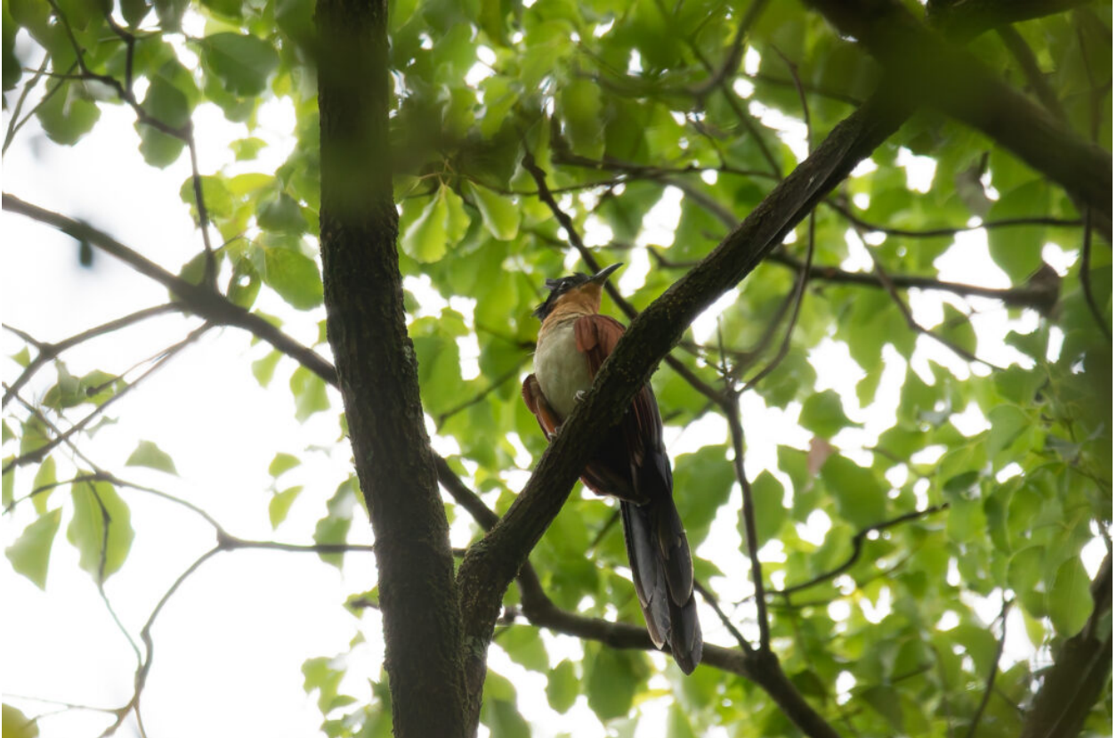
Chestnut-winged Cuckoo