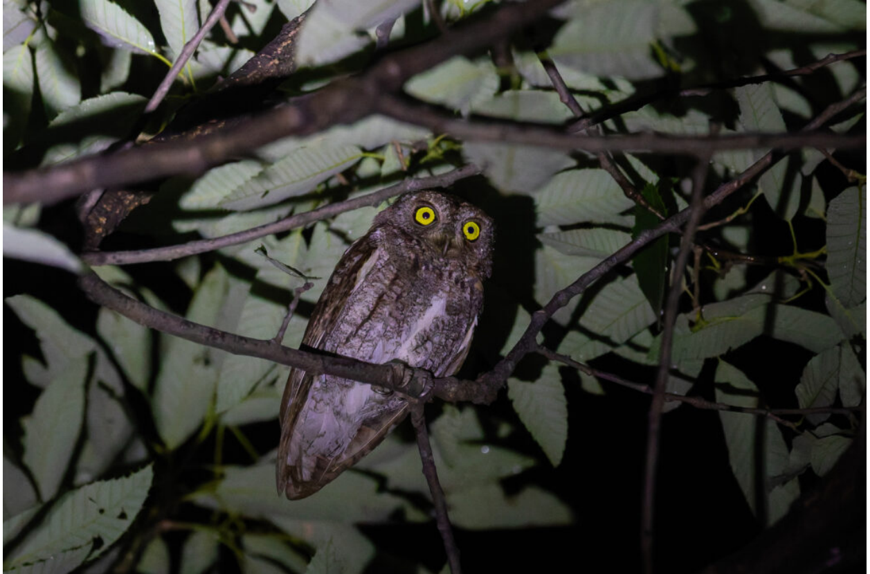
Oriental Scops Owl