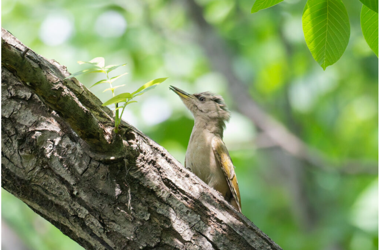
Grey-headed Woodpecker