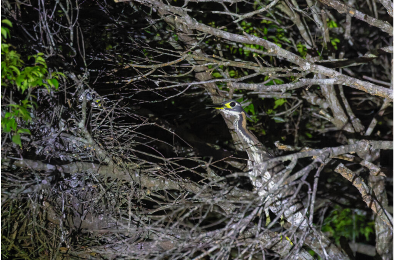
White-eared Night Heron