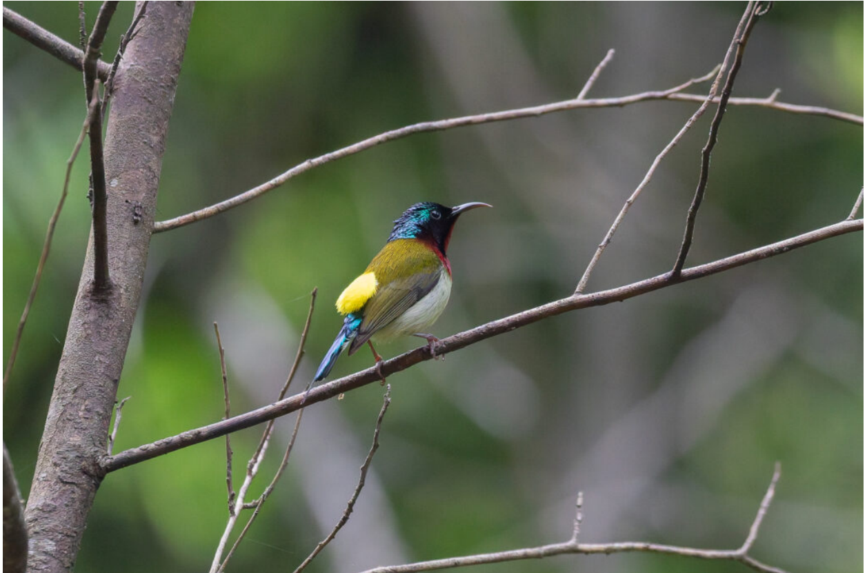
Fork-tailed Sunbird