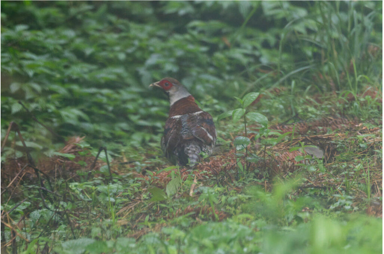
Elliot's Pheasant