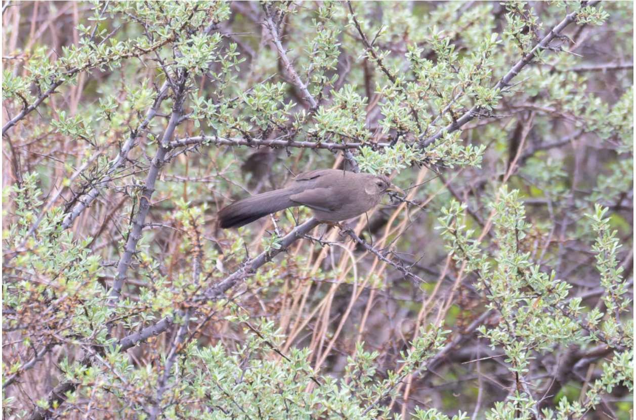
Plain Laughingthrush