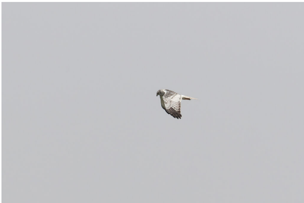
Eastern Marsh Harrier