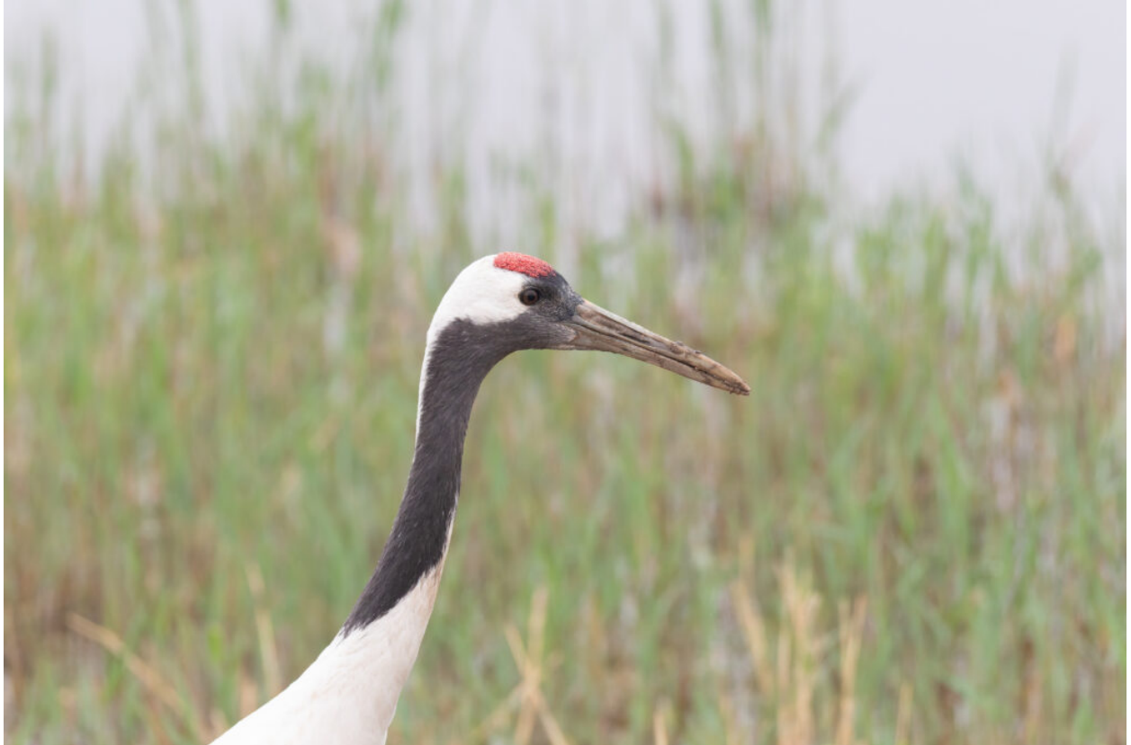
Red-crowned Crane