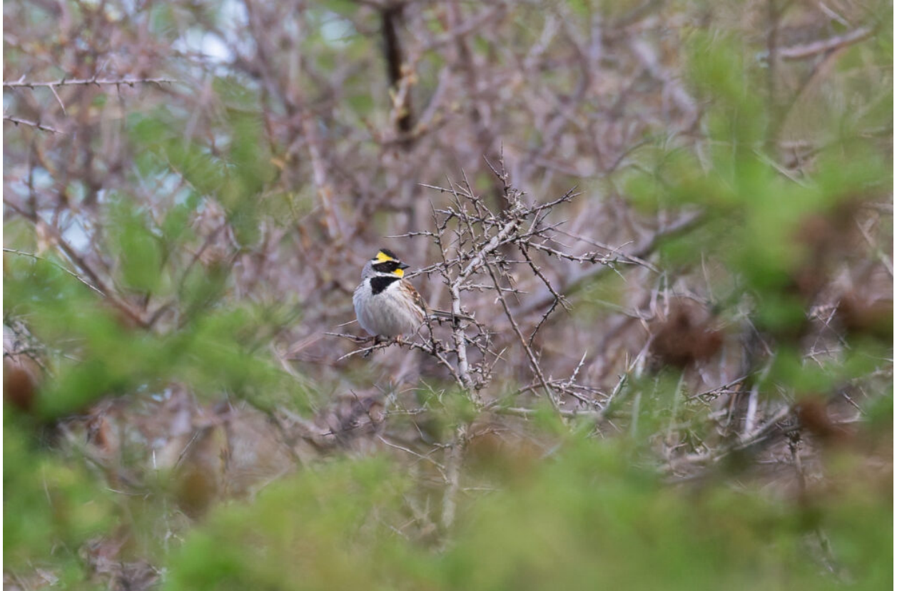
Yellow-browed Bunting