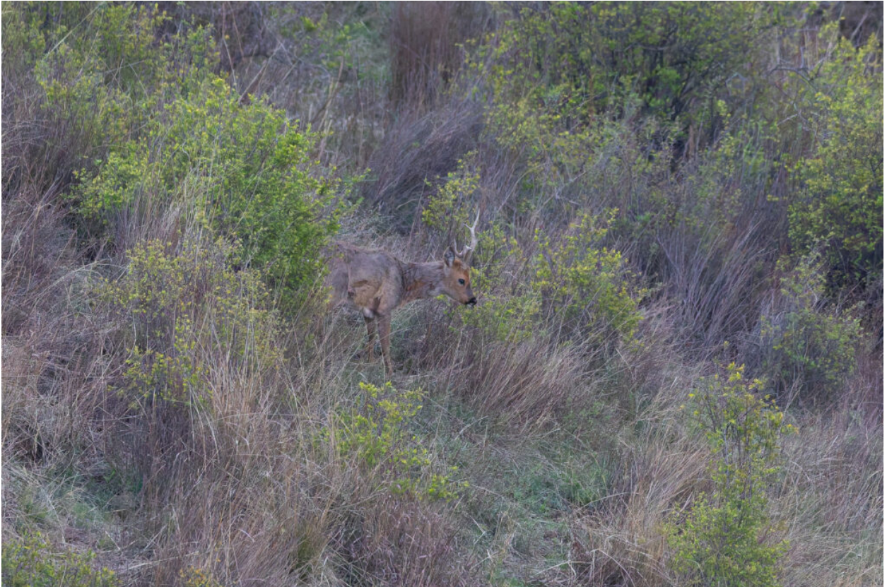
Eastern Roe Deer