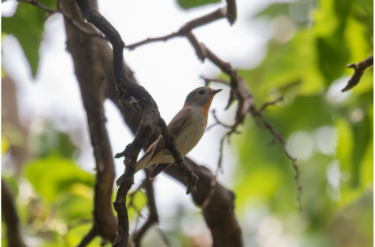
Taiga Flycatcher