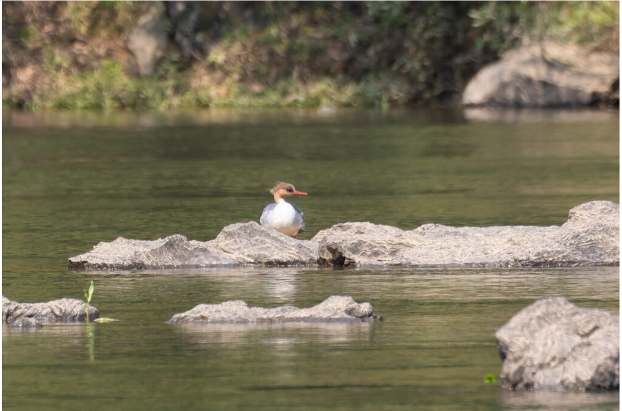
female Scaly-sided Merganser