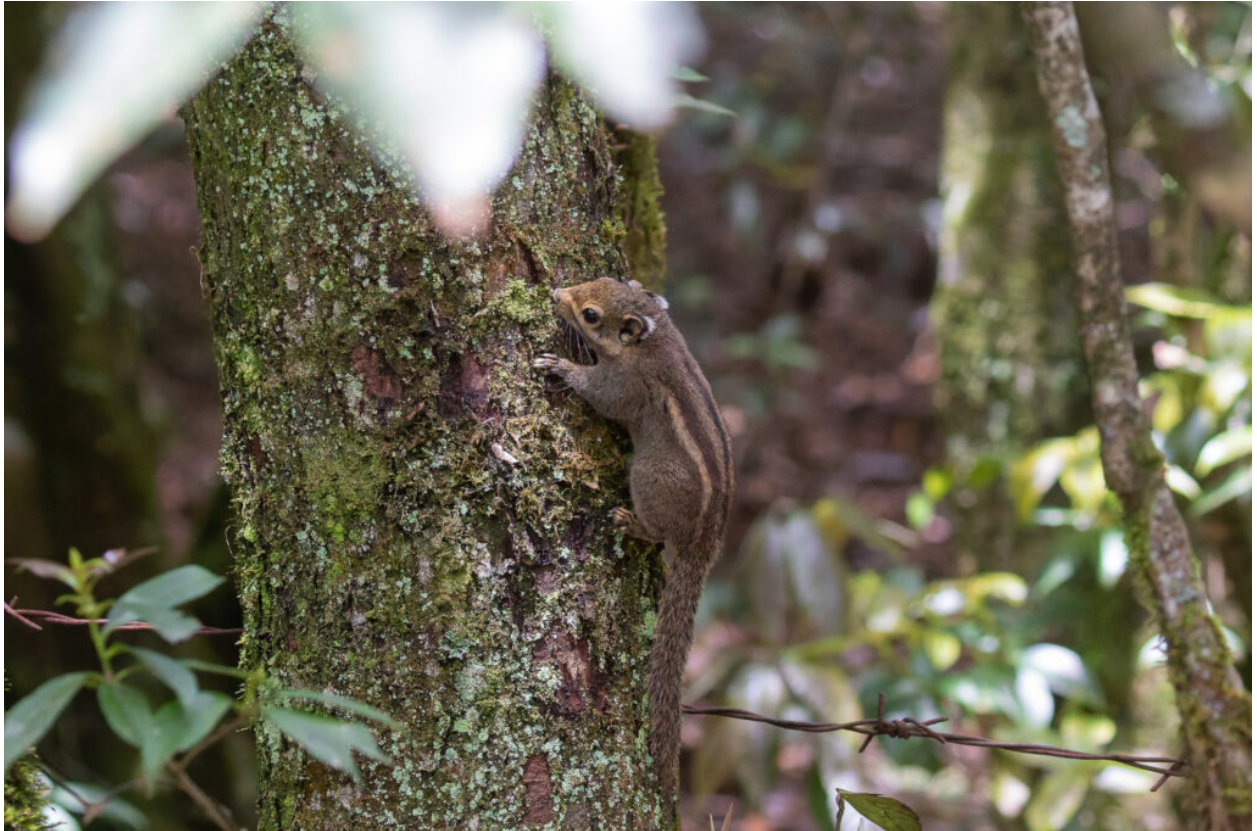
Maritime Striped Squirrel