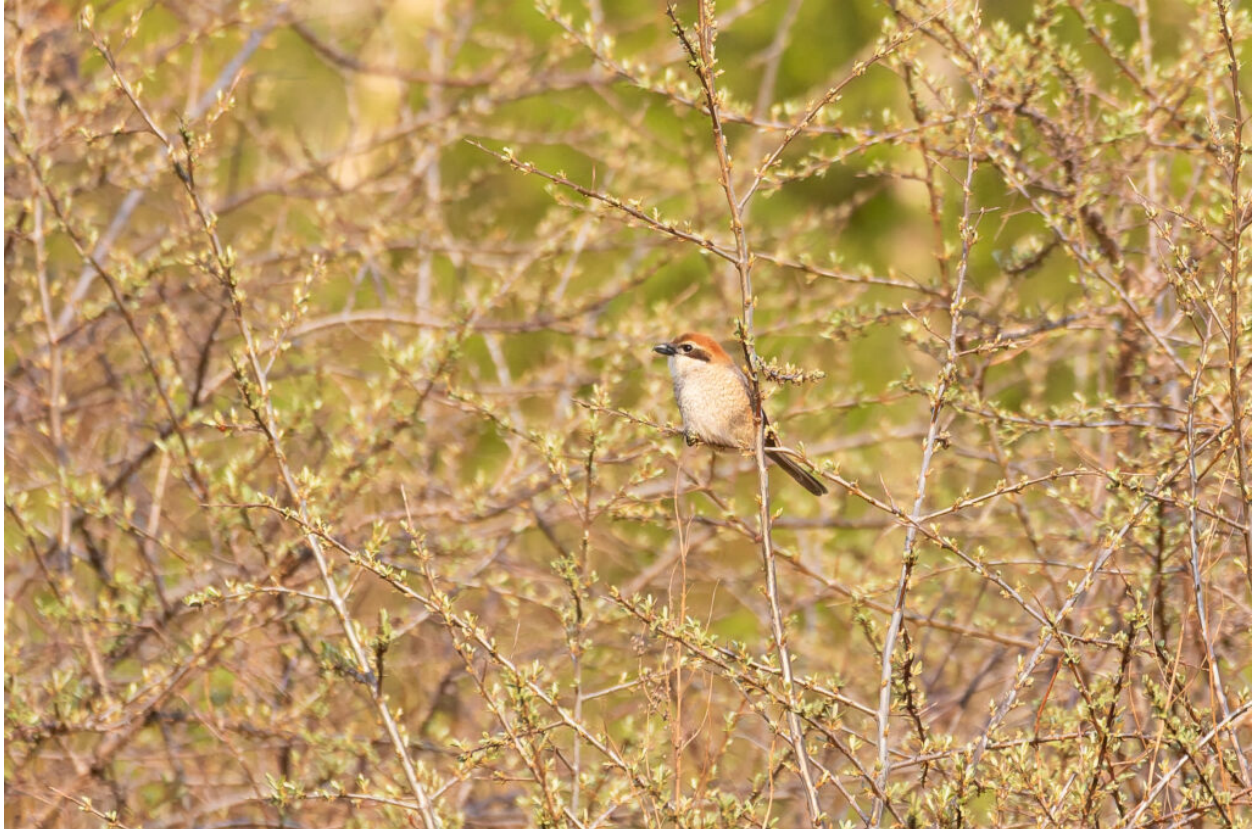
male Bull-headed Shrike