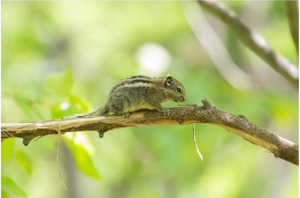
Swinhoes Striped Squirrel ssp vestitus