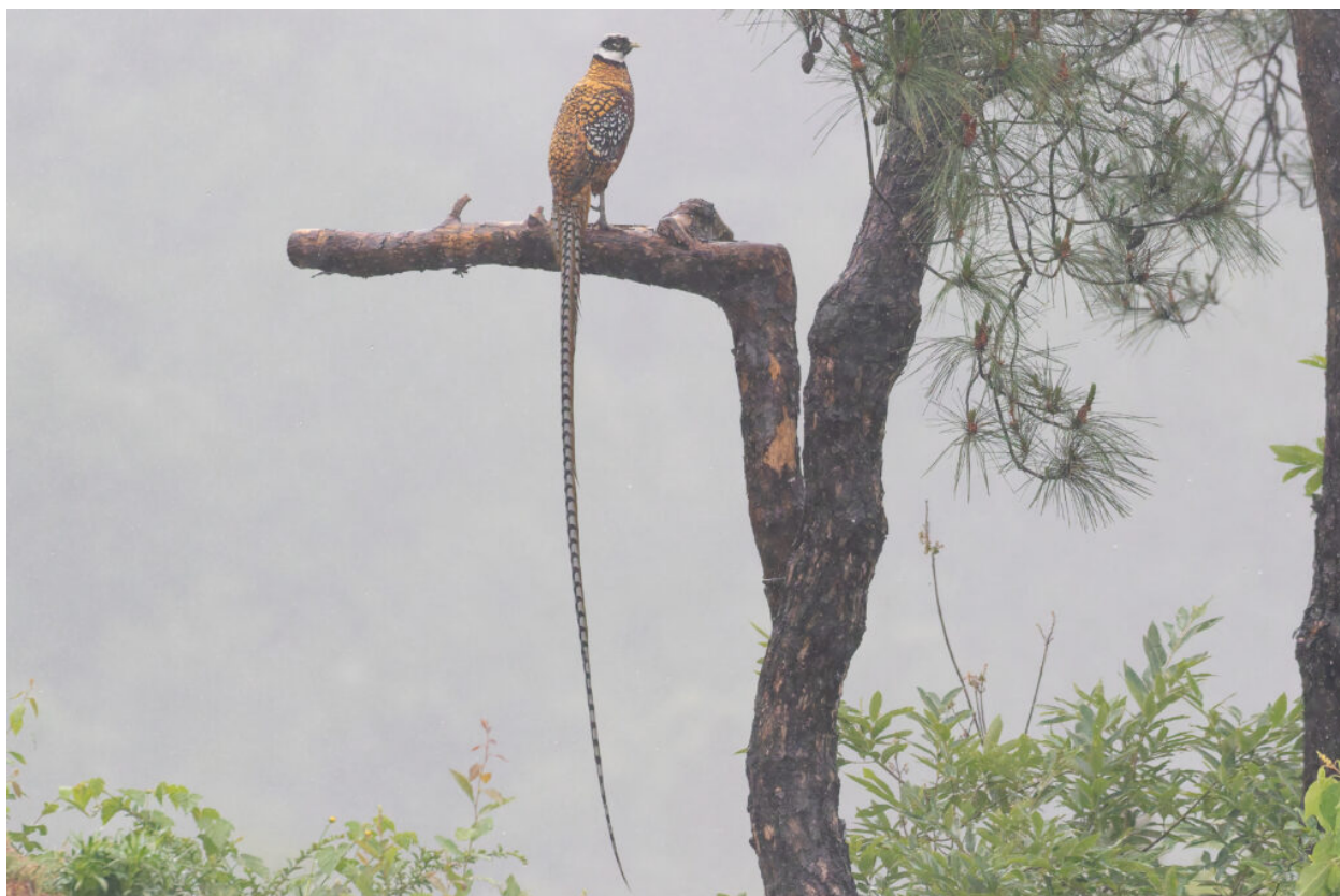
Reeves's Pheasant