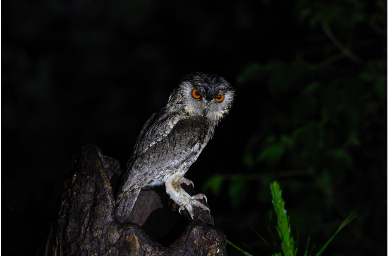
Japanese Scops Owl