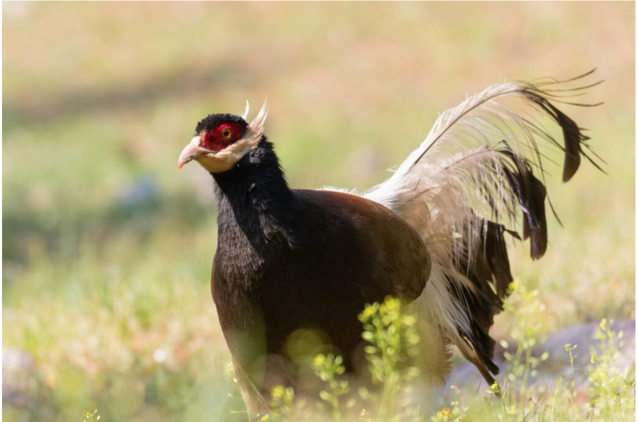
Brown Eared Pheasant