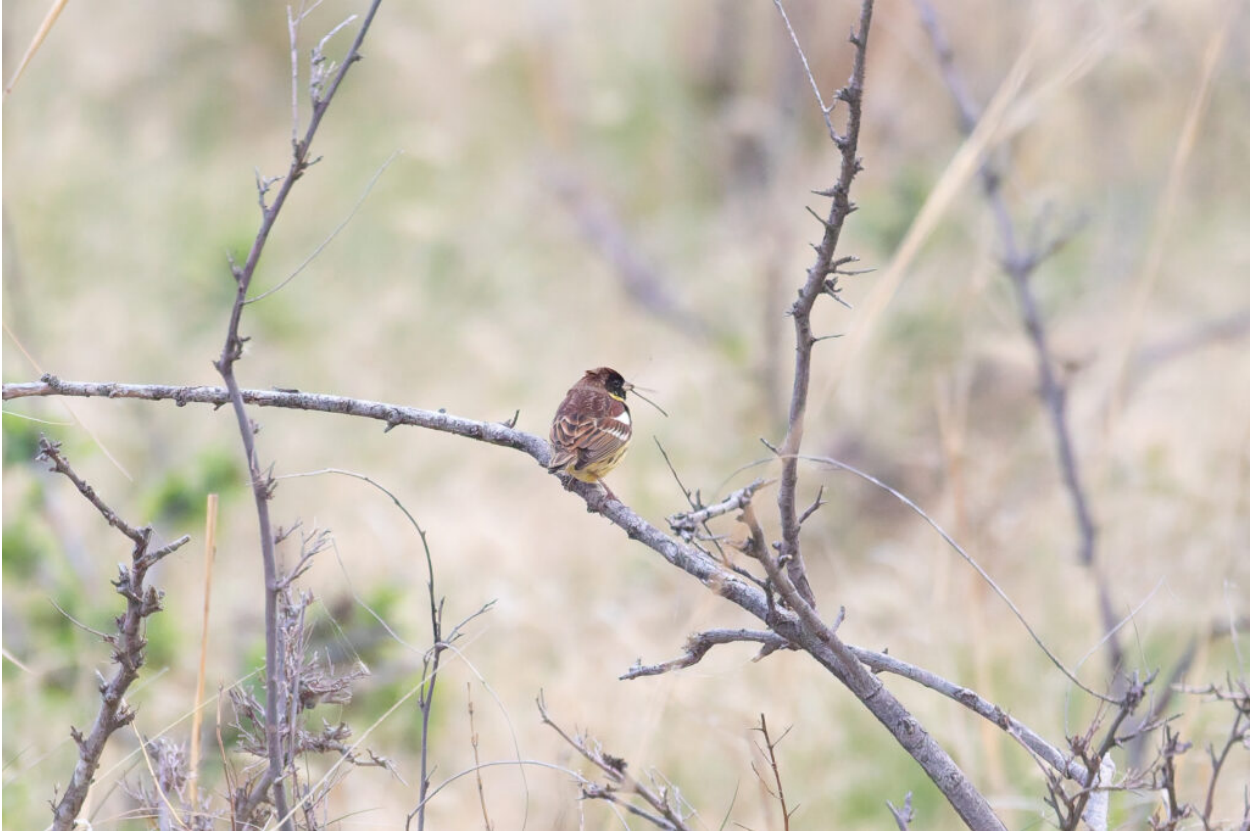
Yellow-breasted Bunting