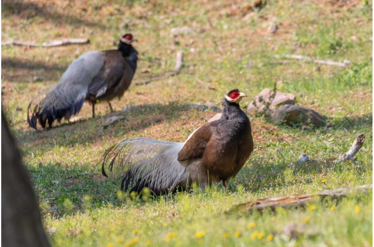
Brown Eared Pheasants