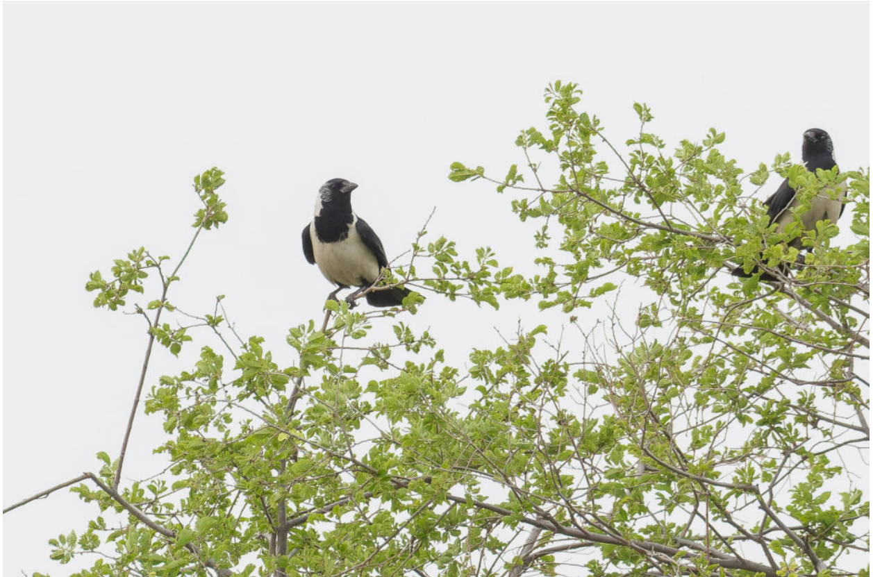
Daurian Jackdaws