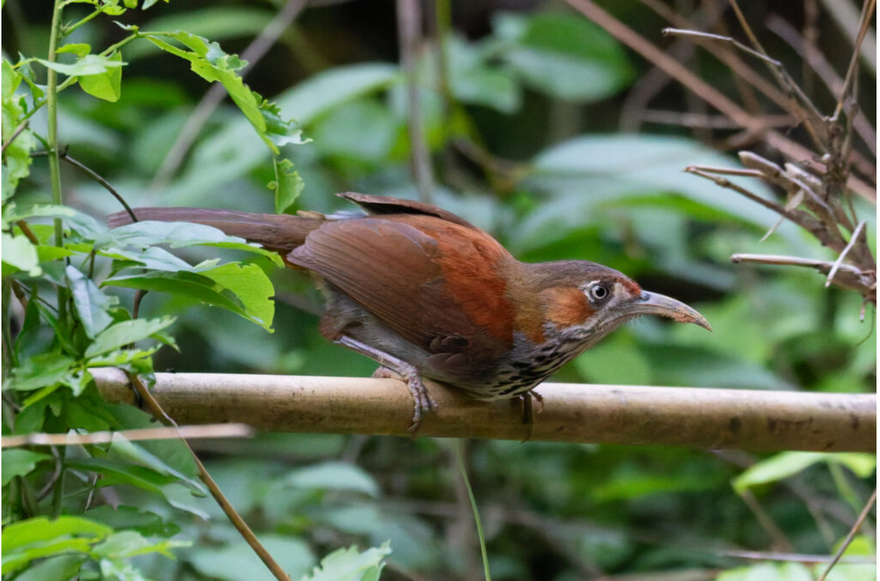
Grey-sided Scimitar Babbler