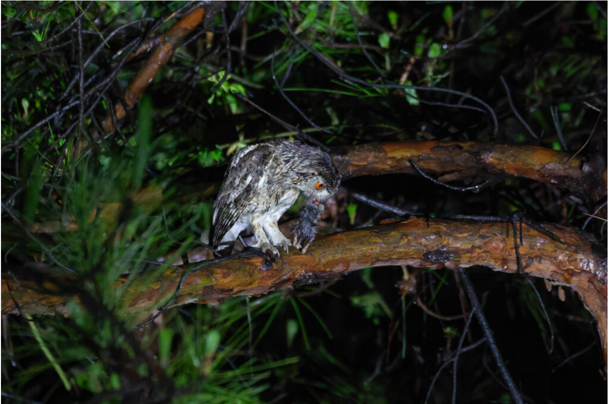
Japanese Scops Owl