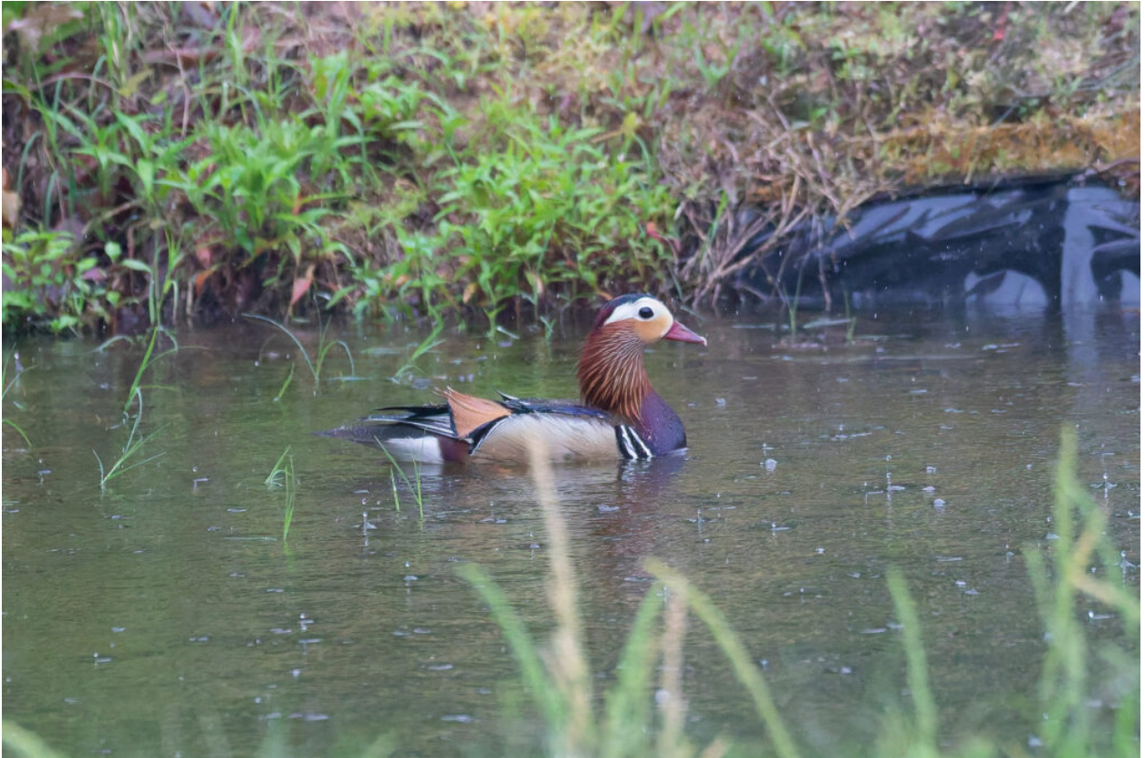
Mandarin Duck