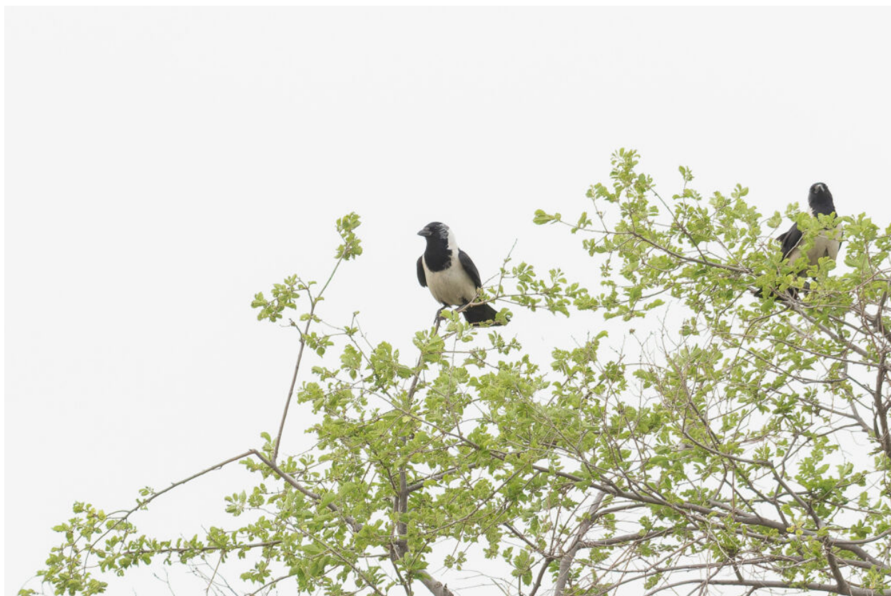
Daurian Jackdaws