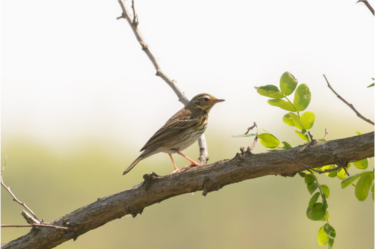
Olive-backed Pipit