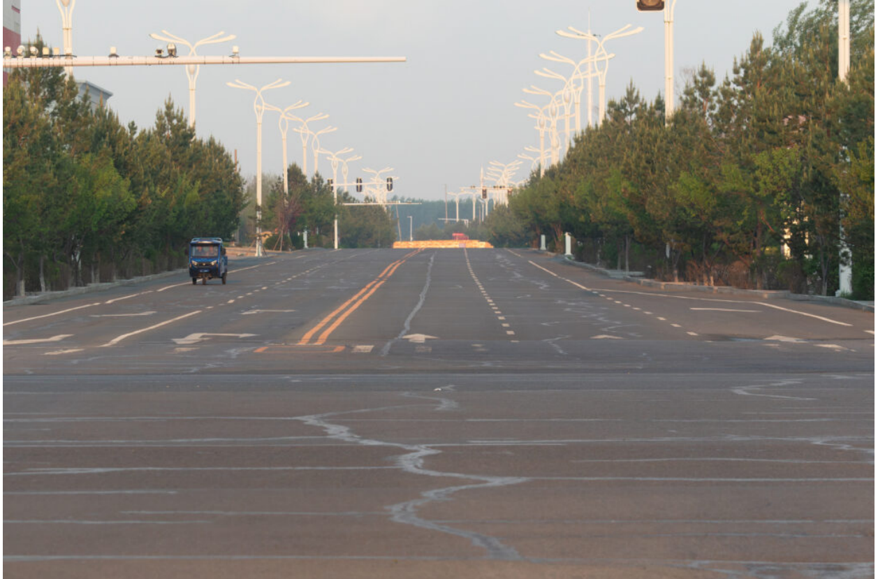
the roads into Inner Mongolia