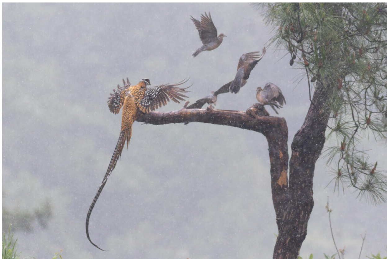
Reeves's Pheasant with Oriental Turtle Doves