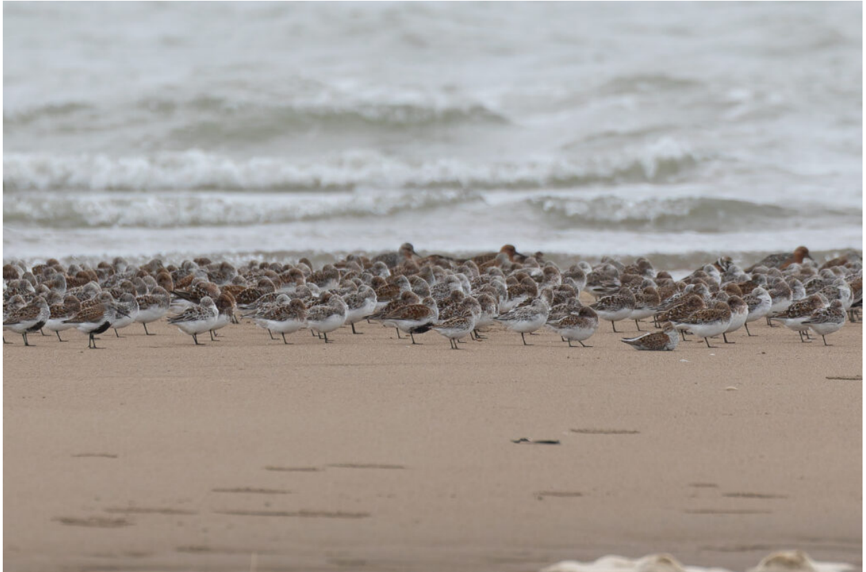
Broad-billed Sandpiper amongst resting sandpipers