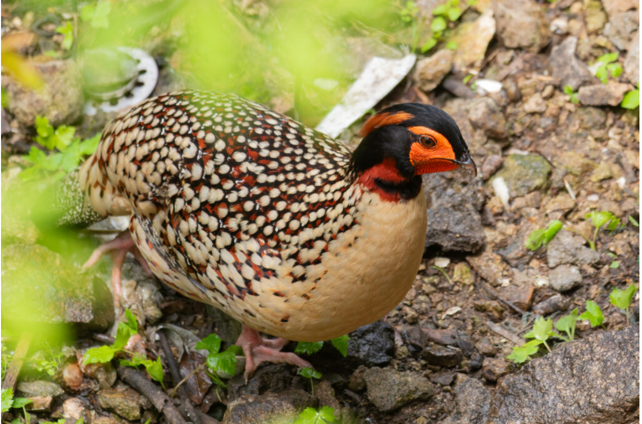
male Cabot's Tragopan