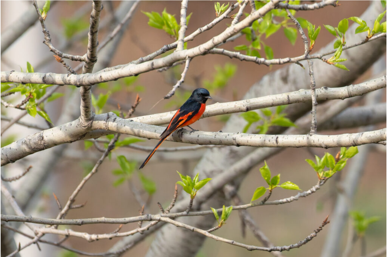
Long-tailed Minivet