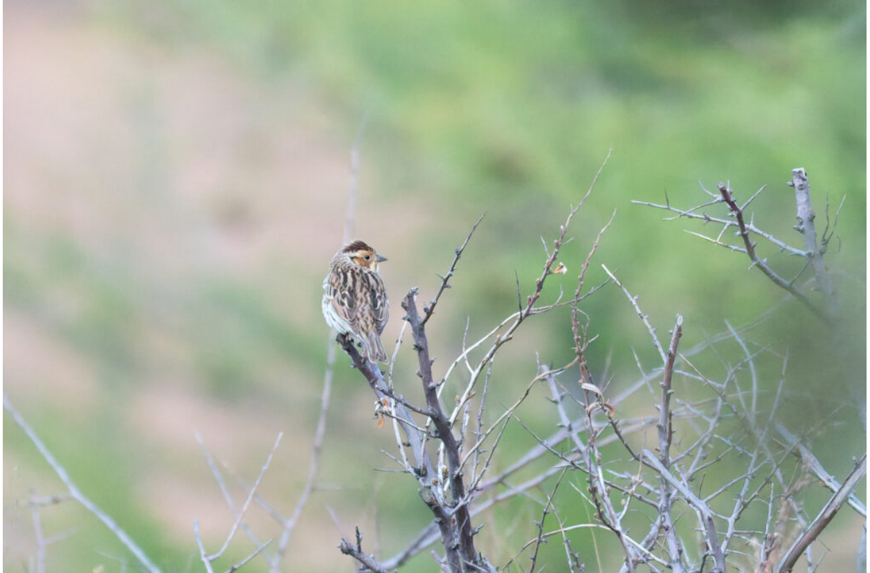
Little Bunting