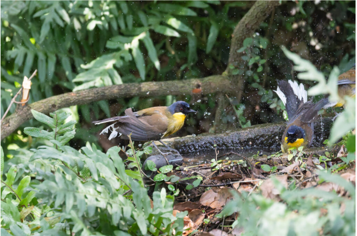
Blue-crowned Laughingthrushes