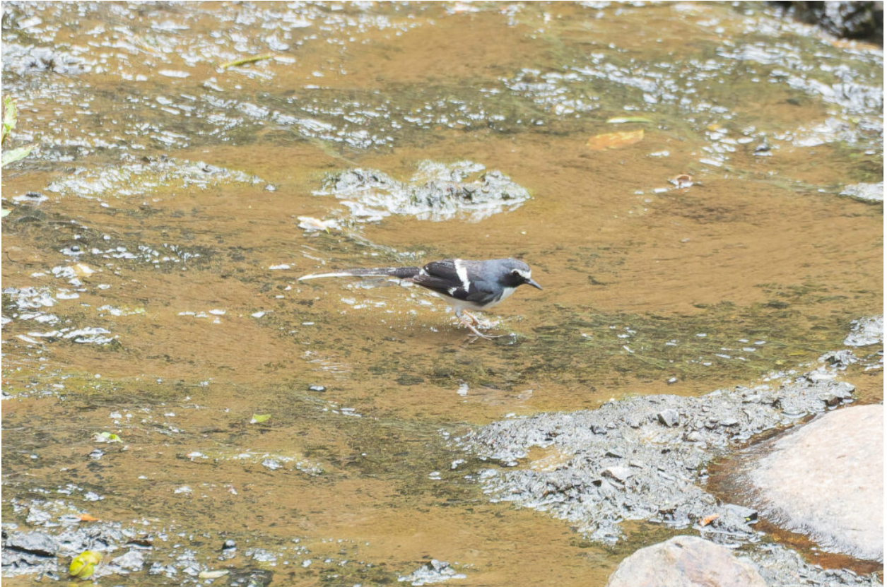
Slaty-backed Forktail