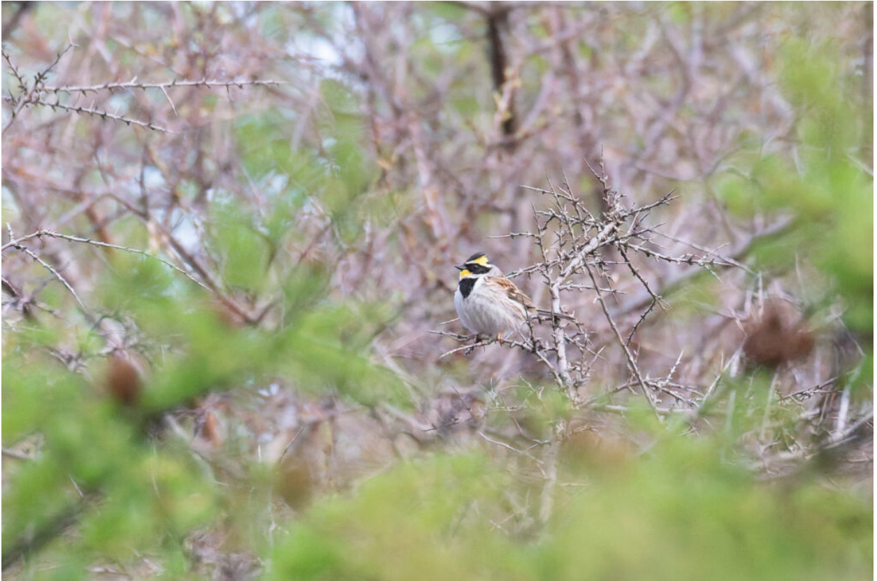
Yellow-browed Bunting