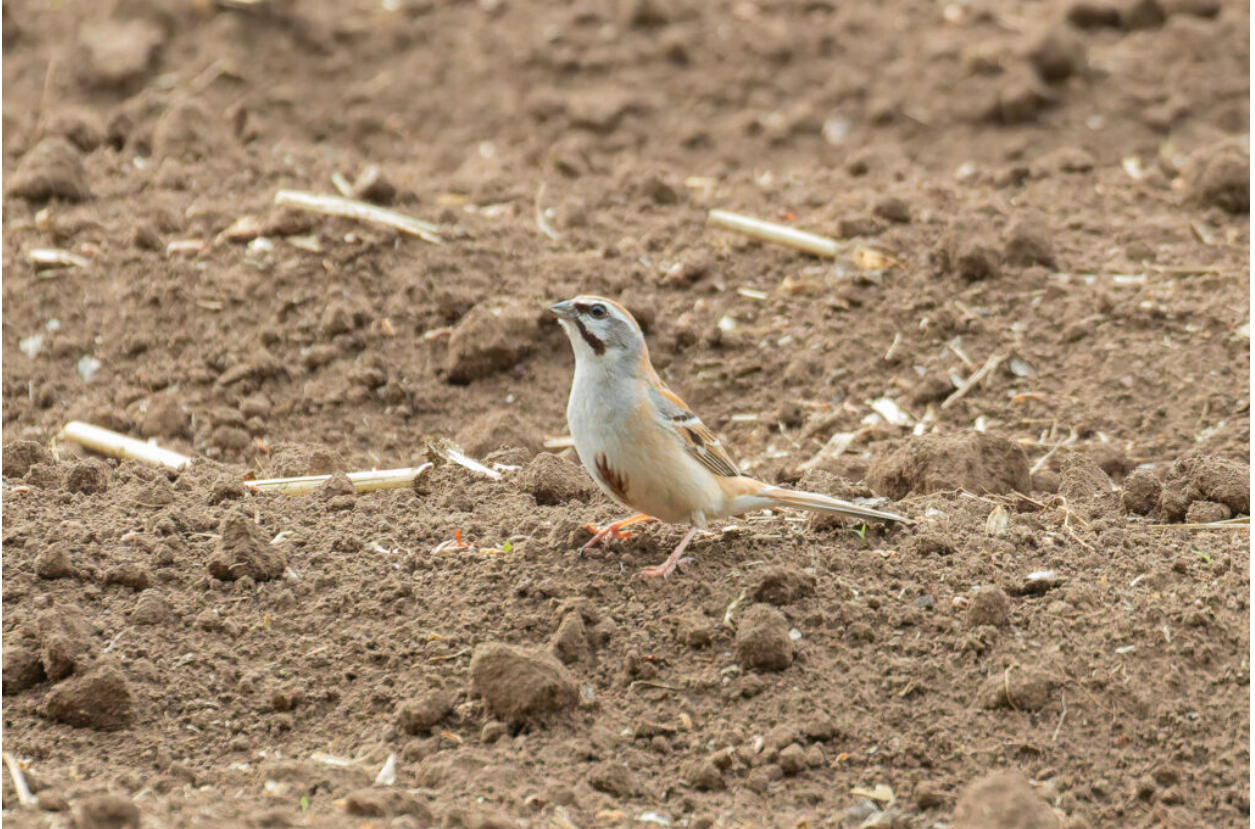
Jankowski's Bunting