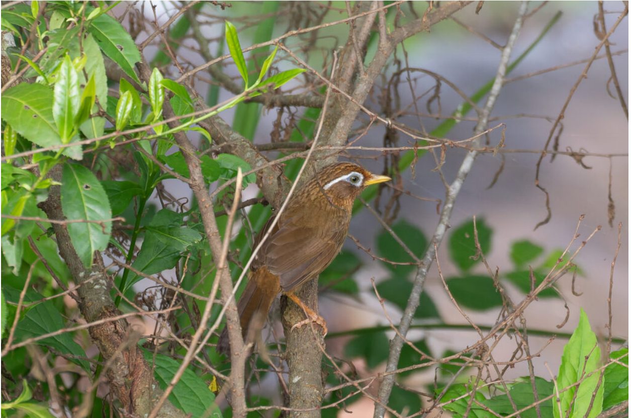
Chinese Hwamei