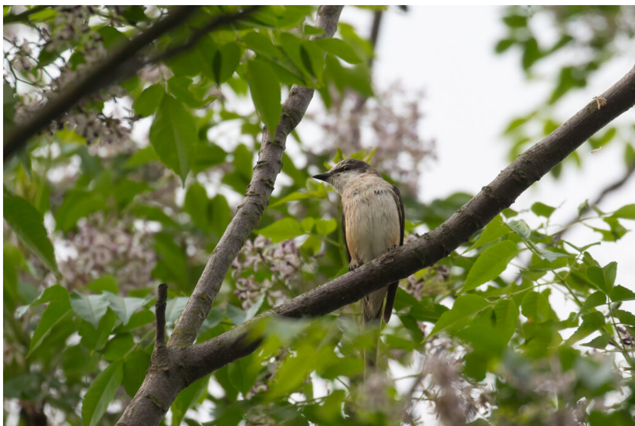
Swinhoe's Minivet