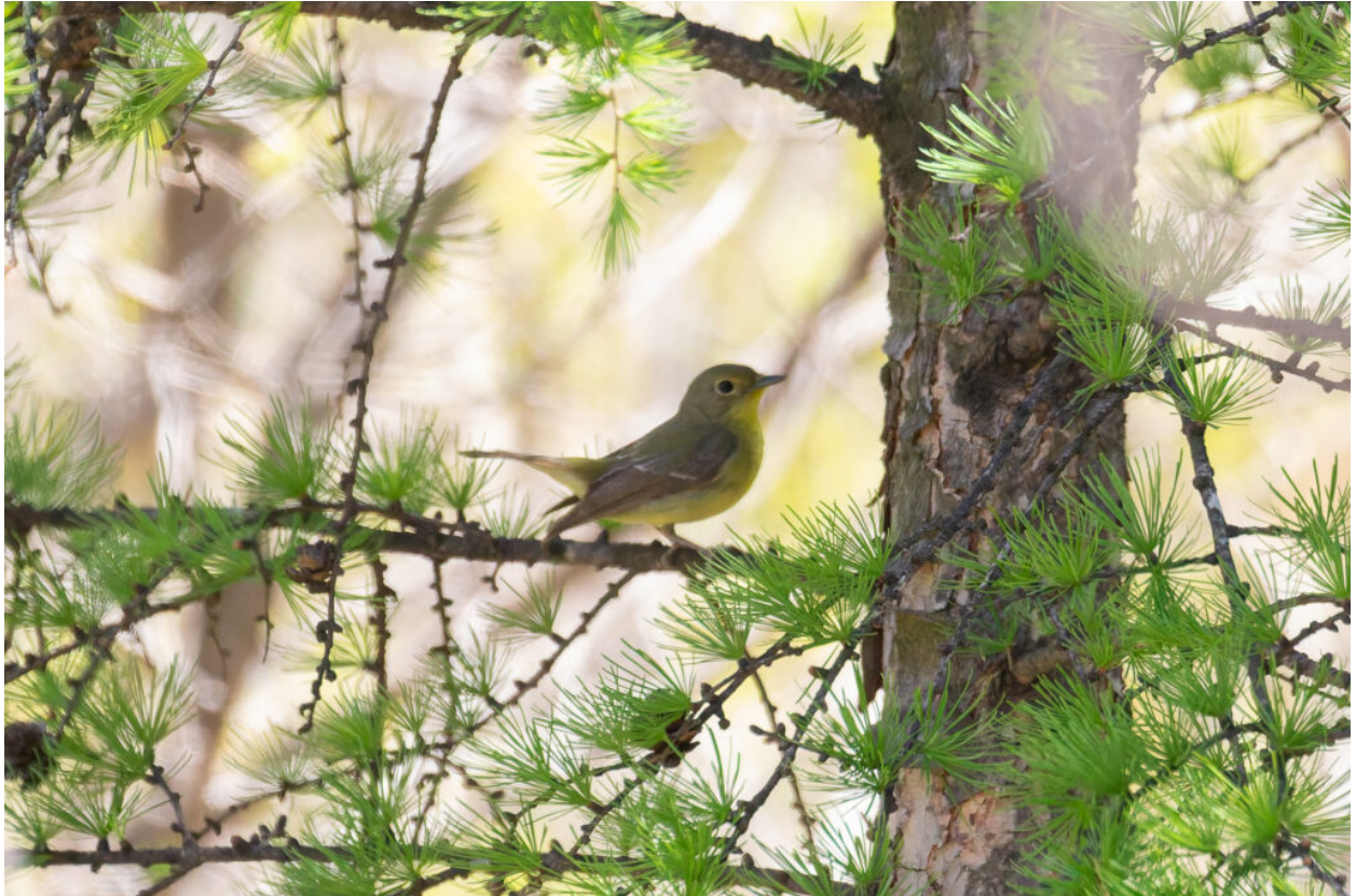
female Green-backed Flycatcher