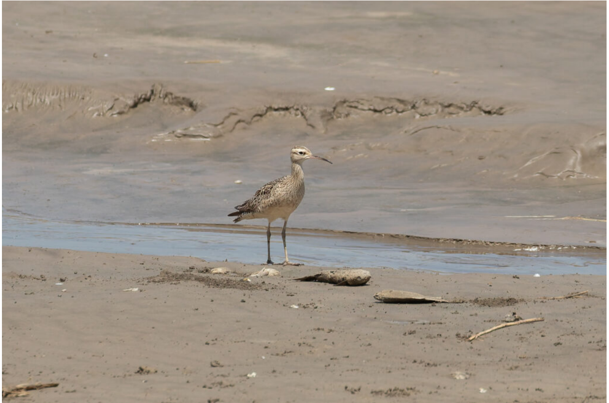
Little Curlew