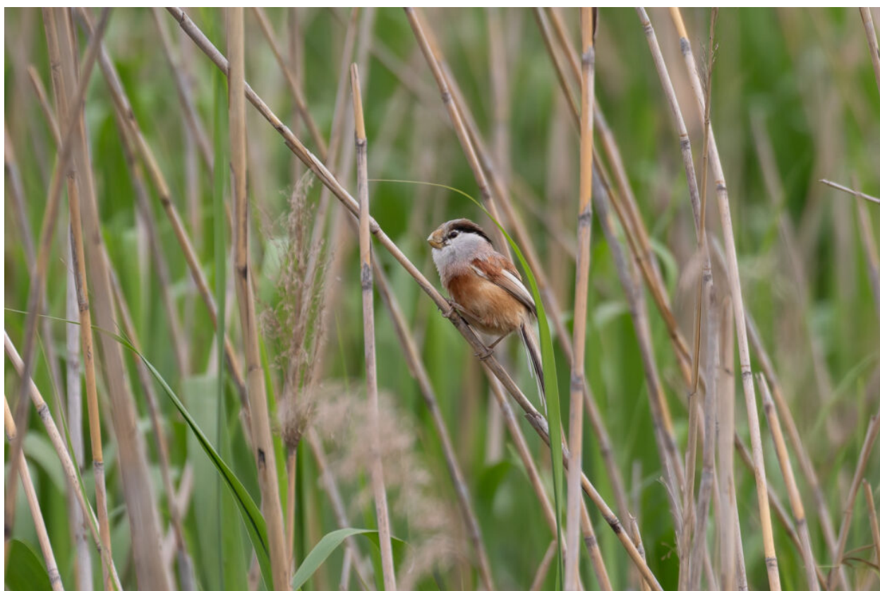
Reed Parrotbill