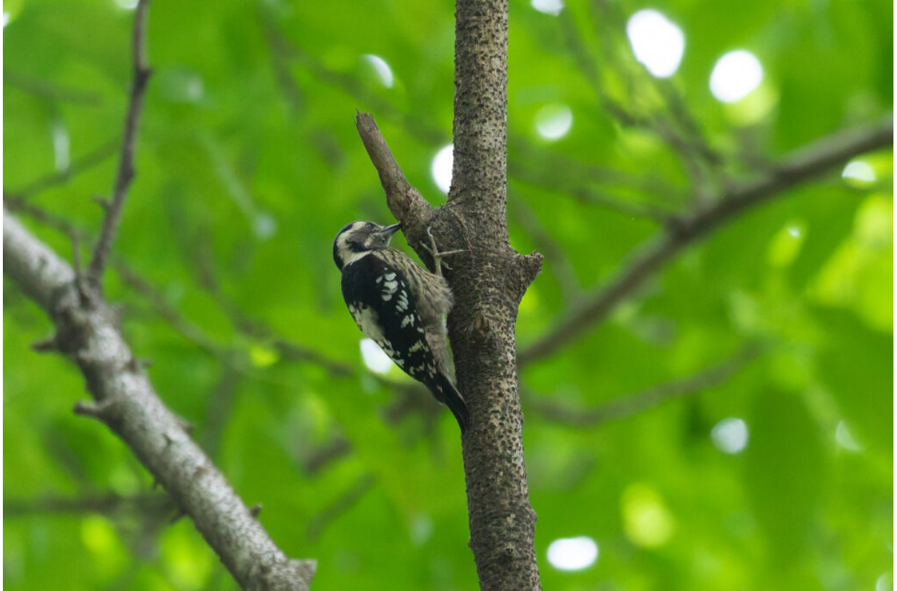
Grey-capped Pygmy Woodpecker (image by Diedert Koppenol)