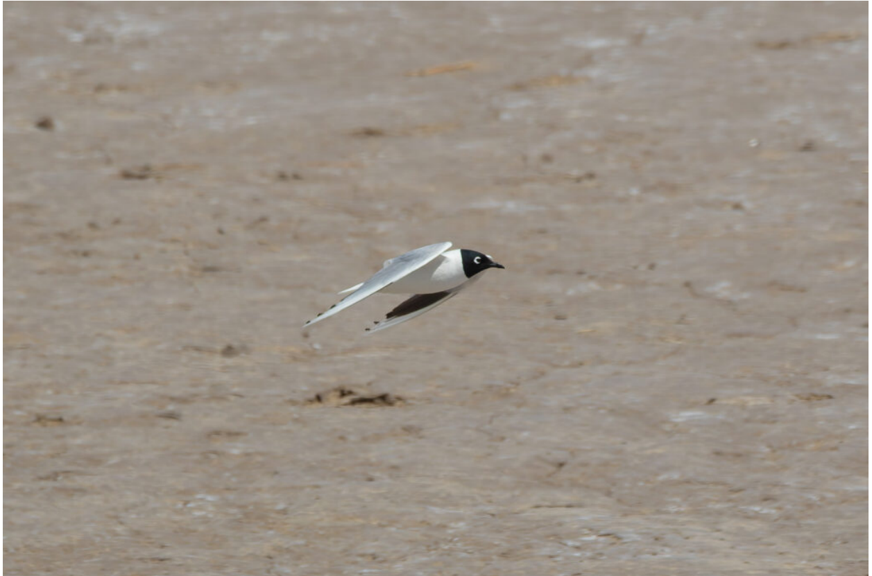
Saunders's Gull