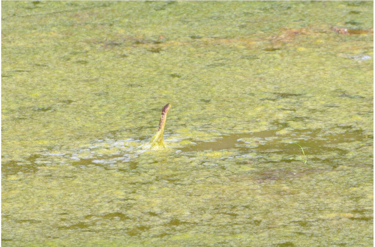
Chinese Water Snake