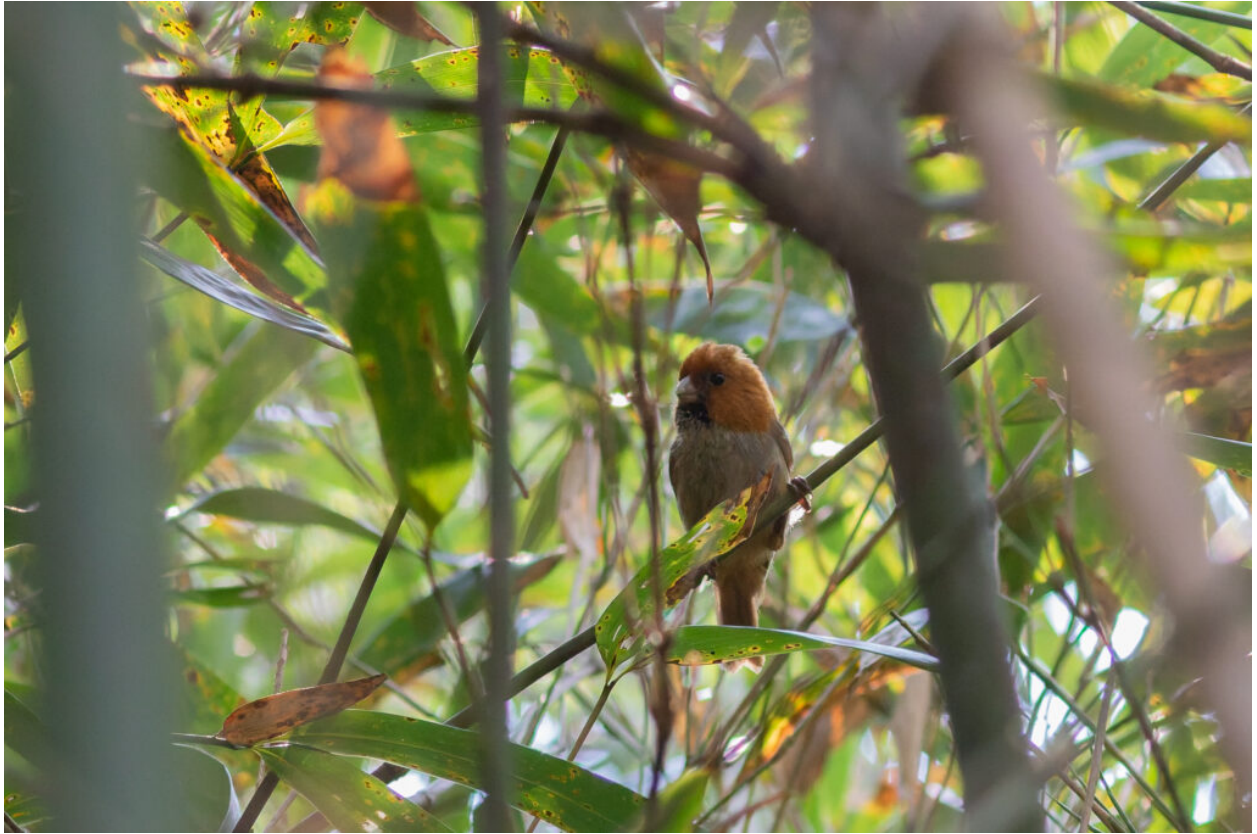
Short-tailed Parrotbill