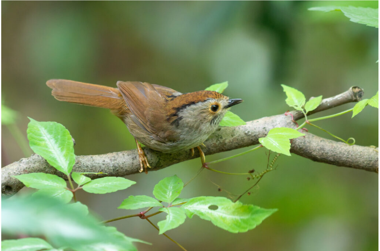
Dusky Fulvetta