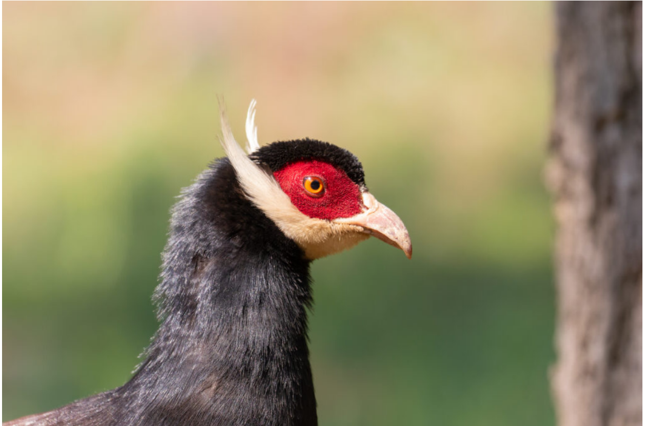
Brown Eared Pheasant