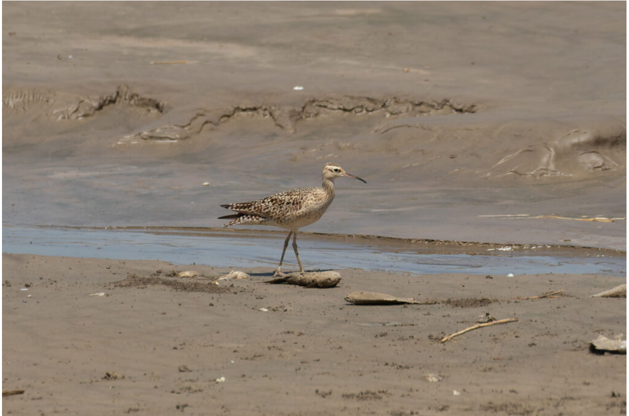
Little Curlew