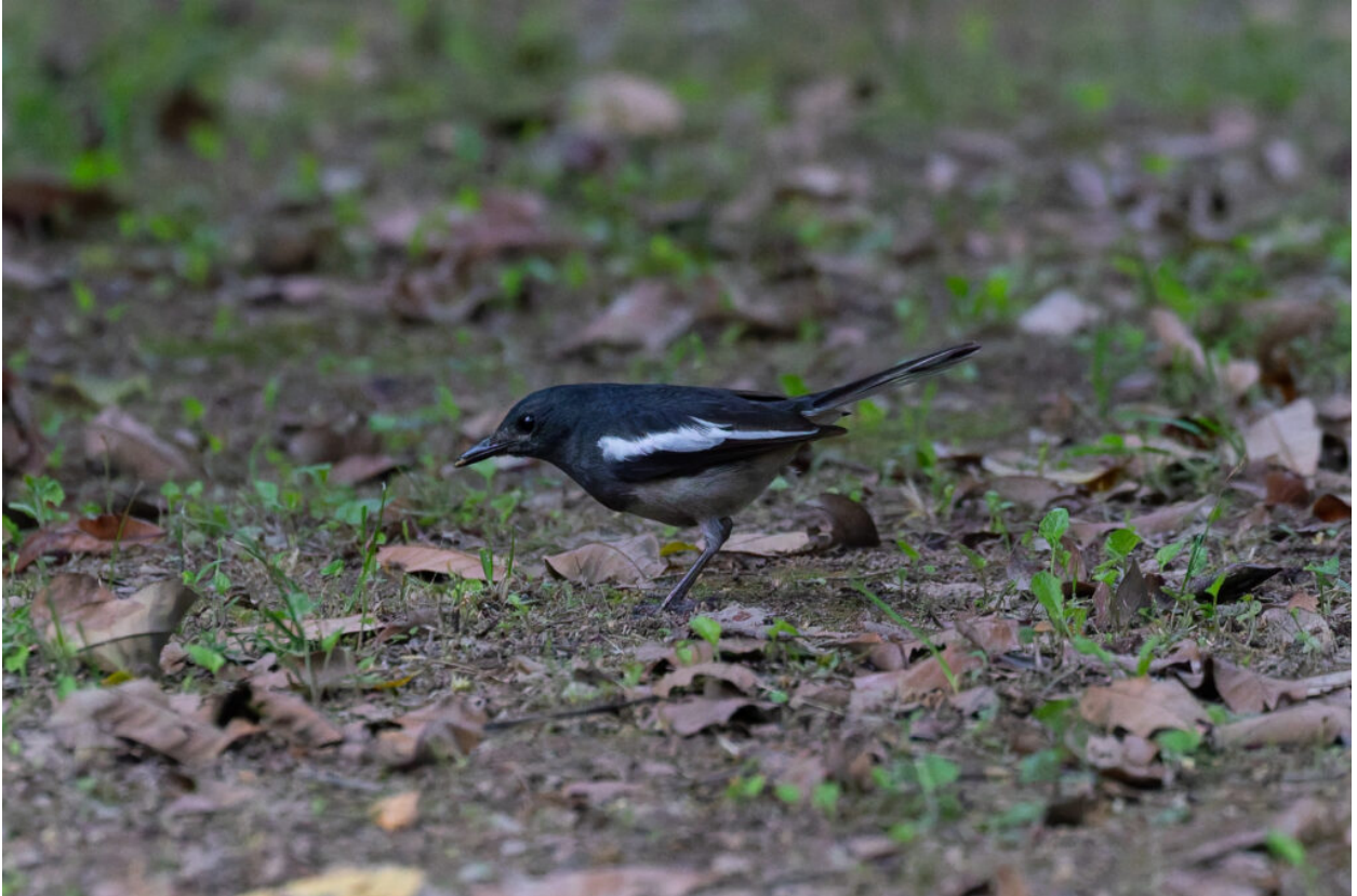
Oriental Magpie-Robin