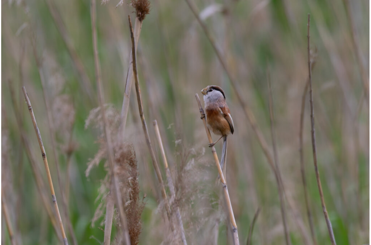
Reed Parrotbill