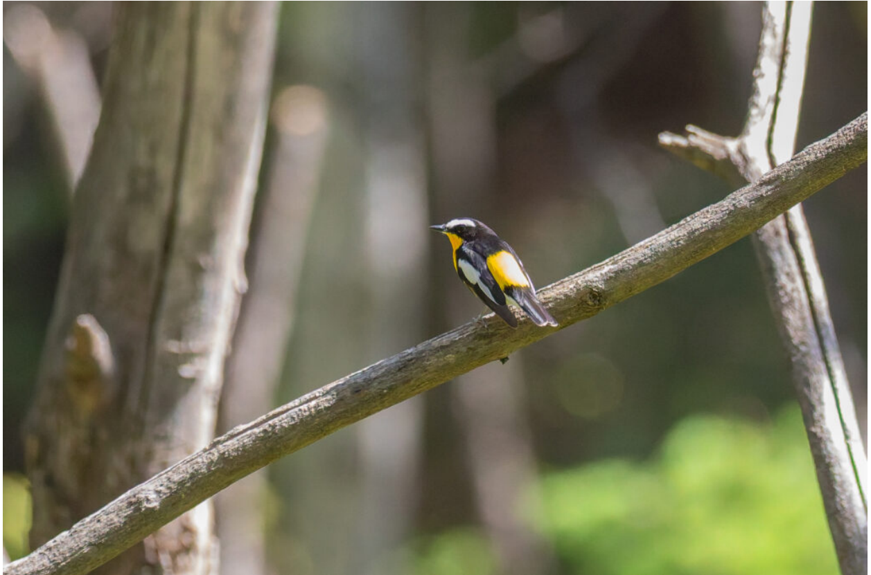
Yellow-rumped Flycatcher