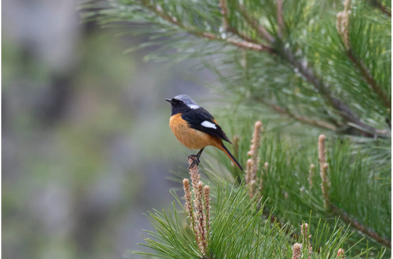
Daurian Redstart