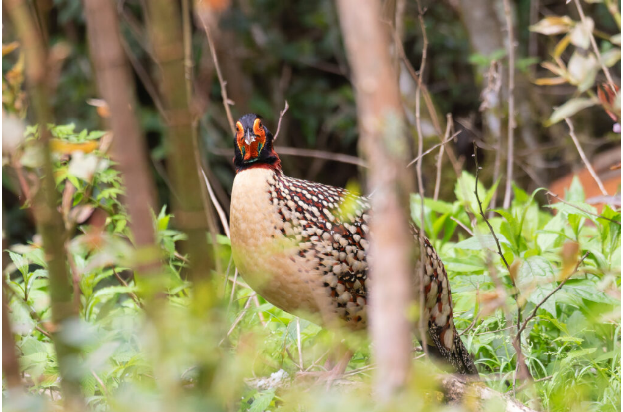
male Cabot's Tragopan