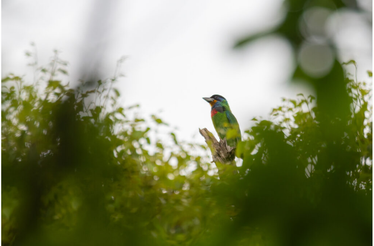
Chinese Barbet