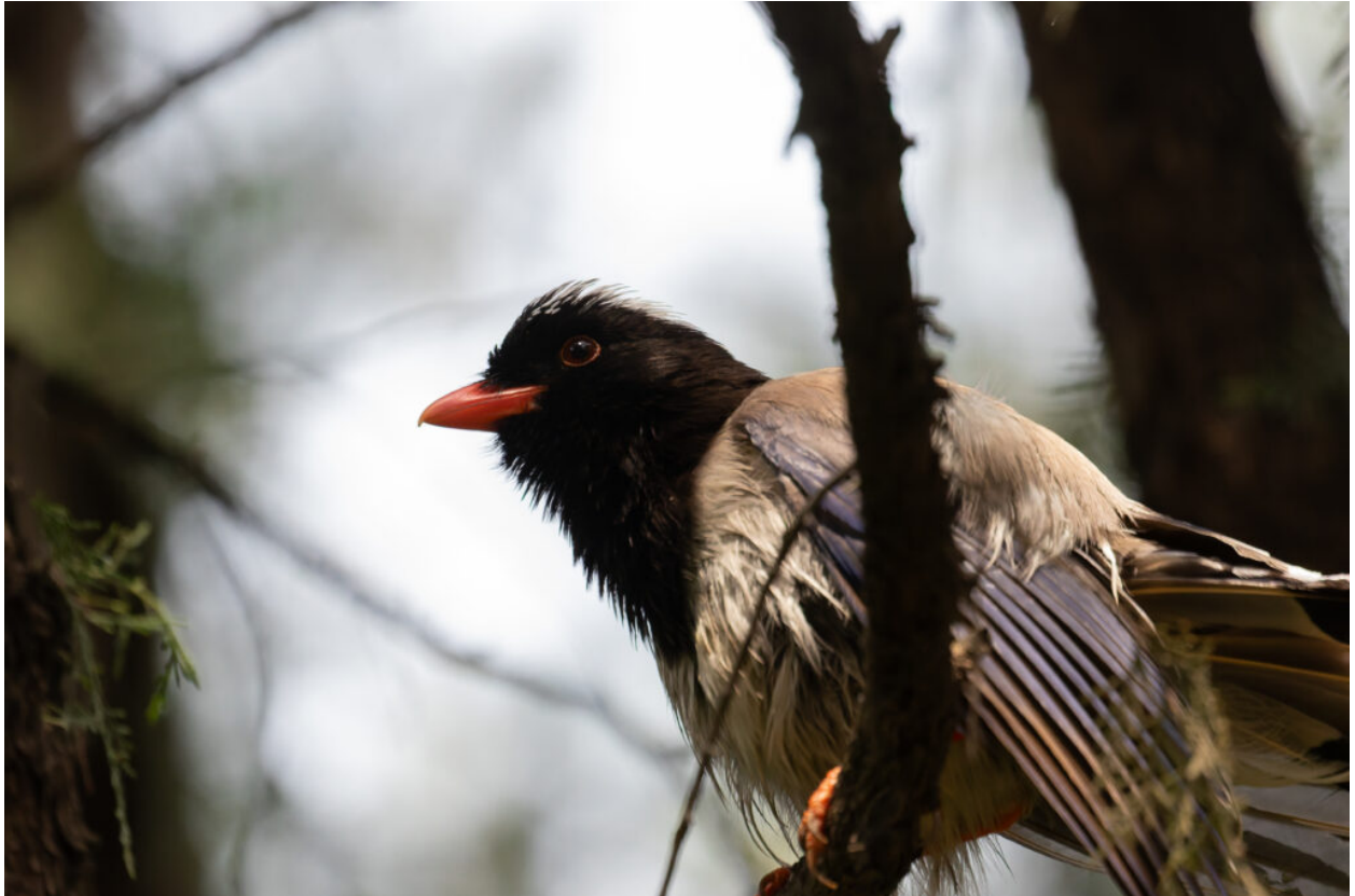
Red-billed Blue Magpie