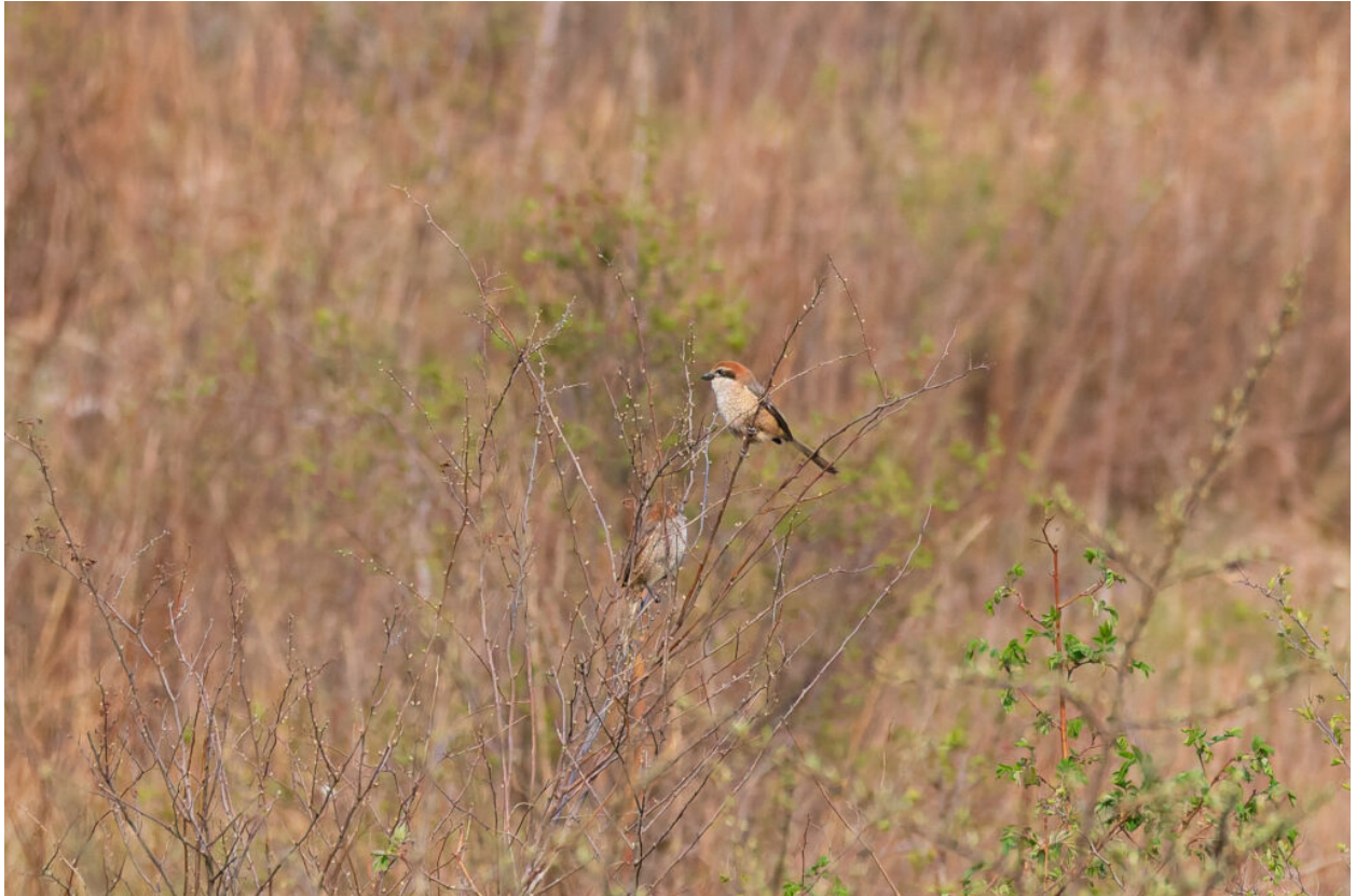
pair of Bull-headed Shrikes