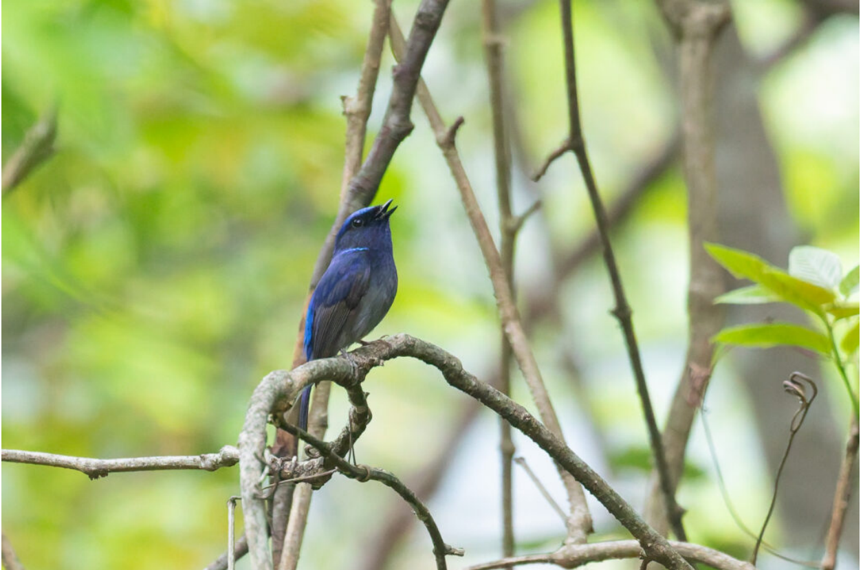
Small Niltava