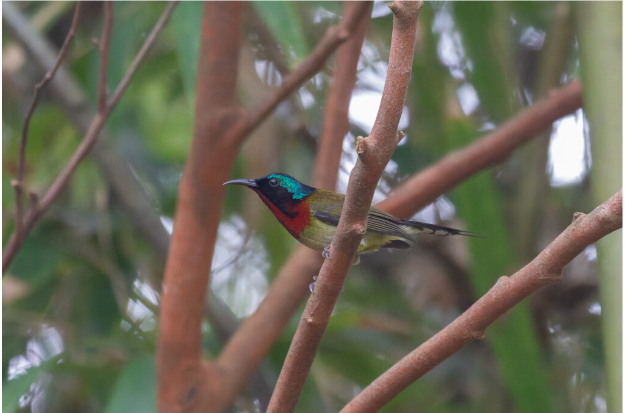
Fork-tailed Sunbird