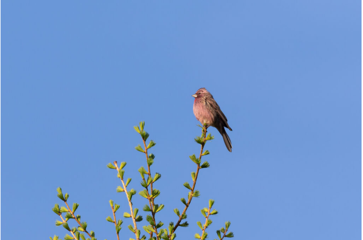
Chinese Beautiful Rosefinch