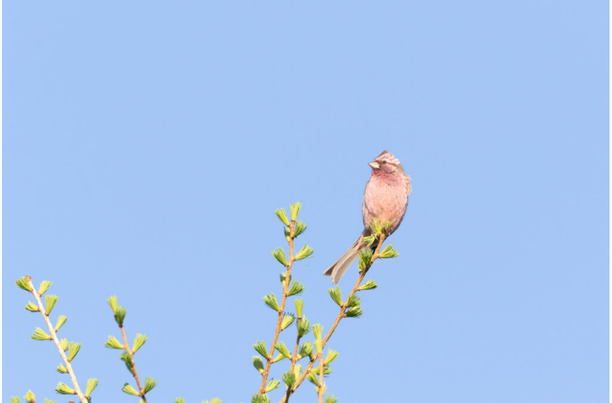
Chinese Beautiful Rosefinch