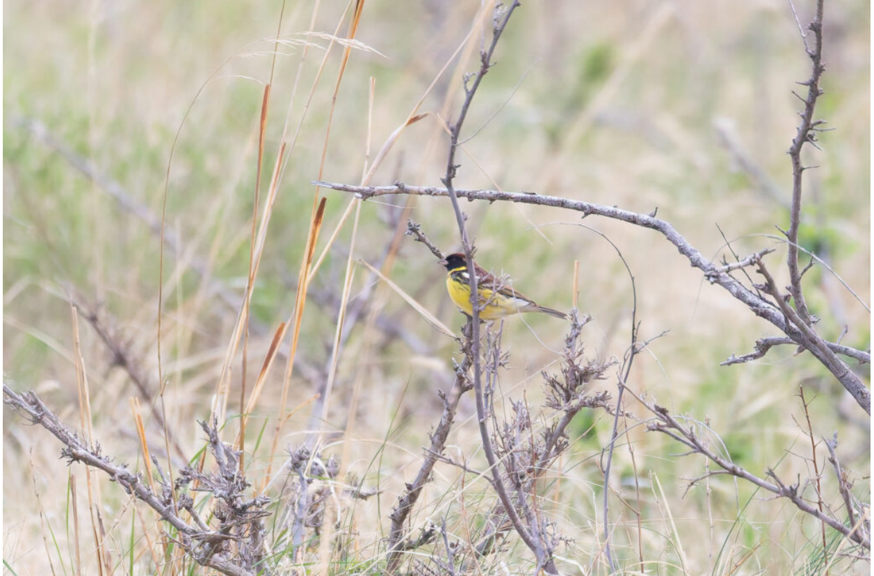
Yellow-breasted Bunting