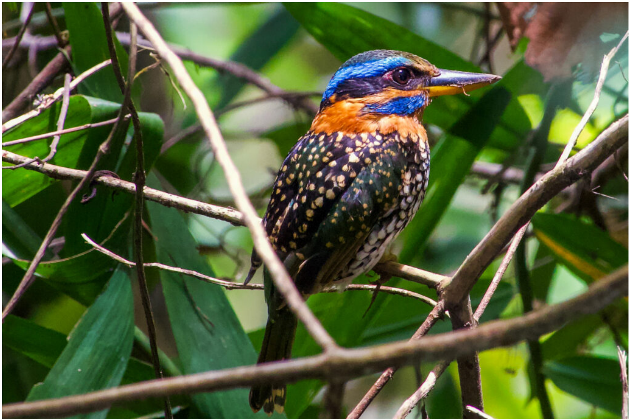
Negros Spotted Kingfisher