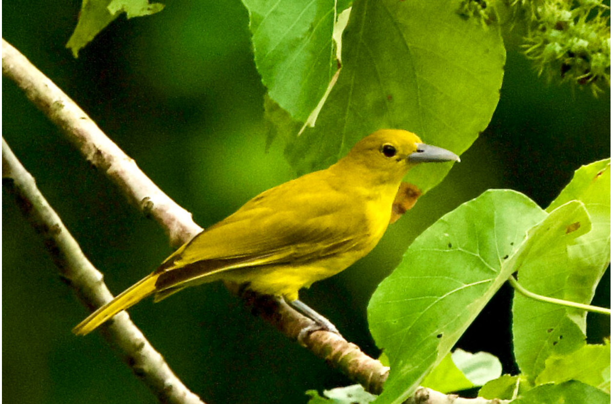
Isabela Oriole