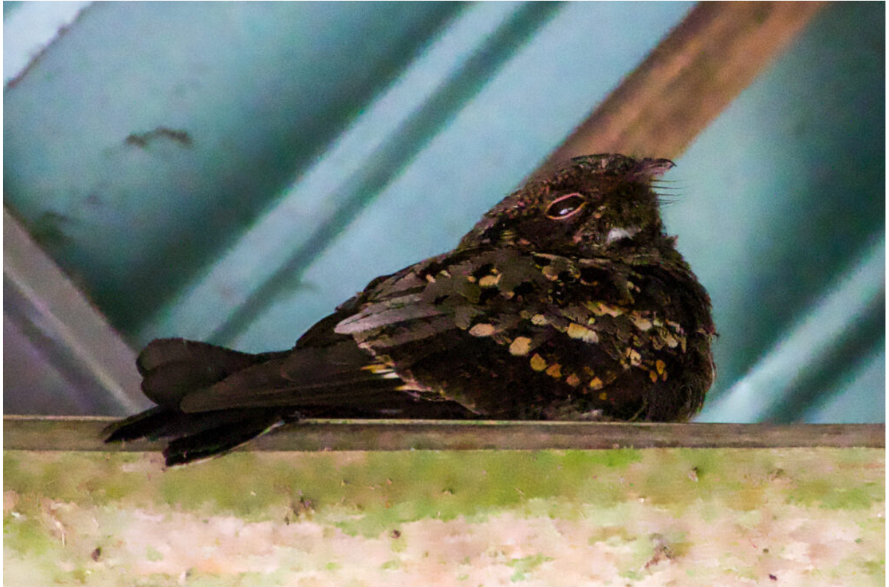
Philippine Nightjar