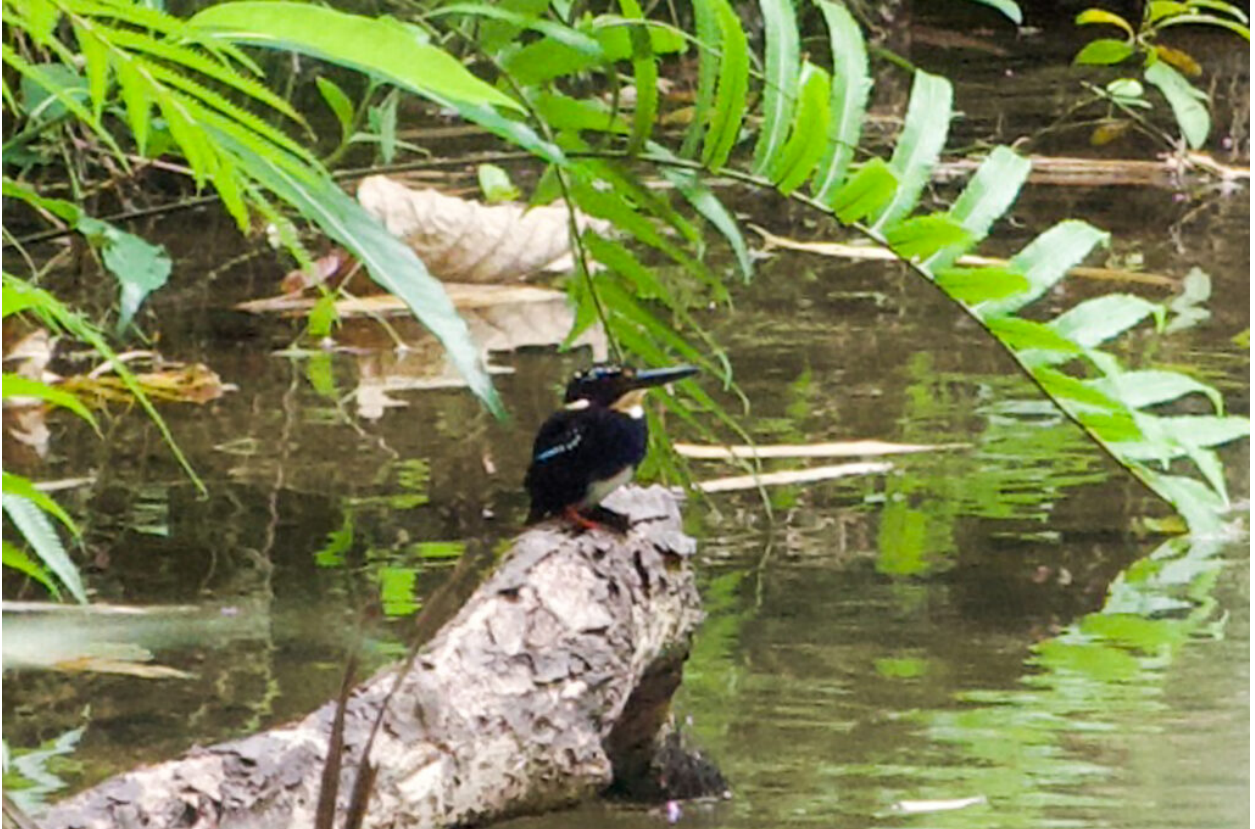
Northern Silvery Kingfisher