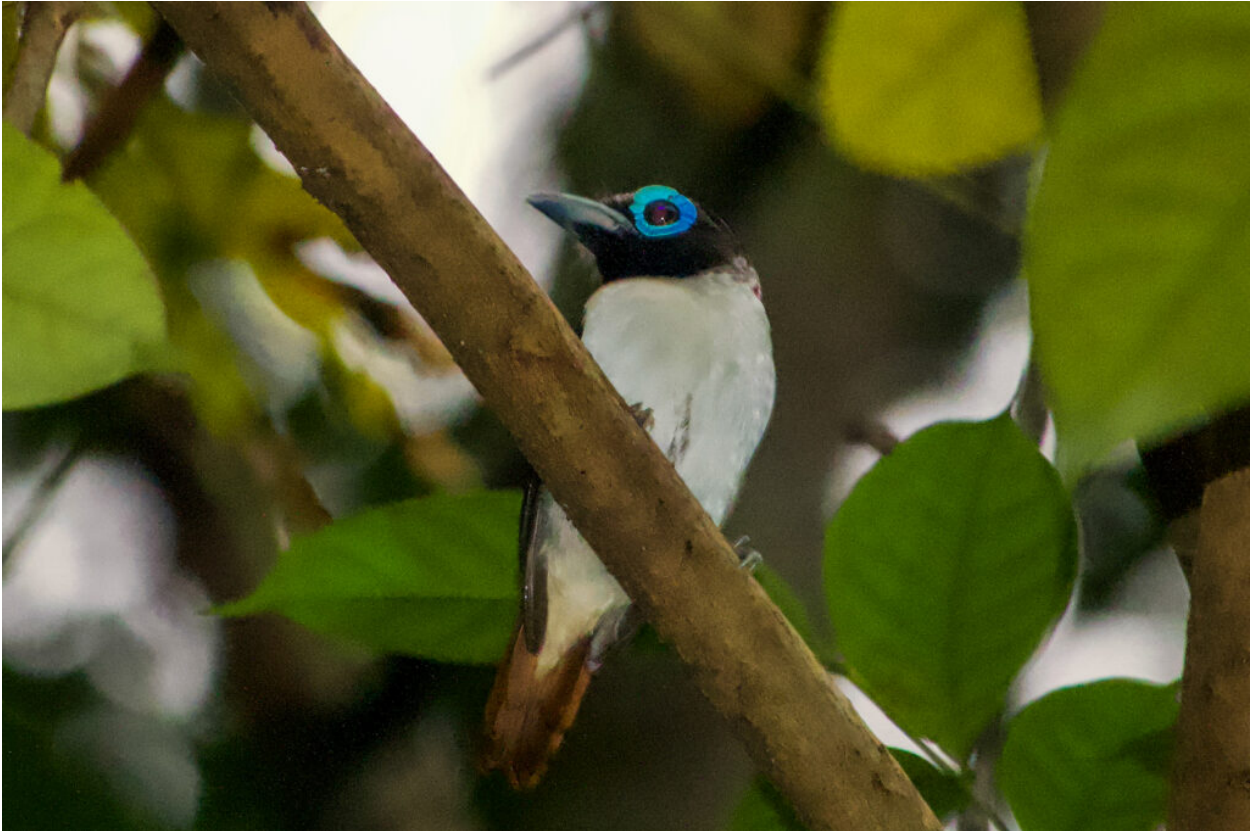
Visayan Broadbill