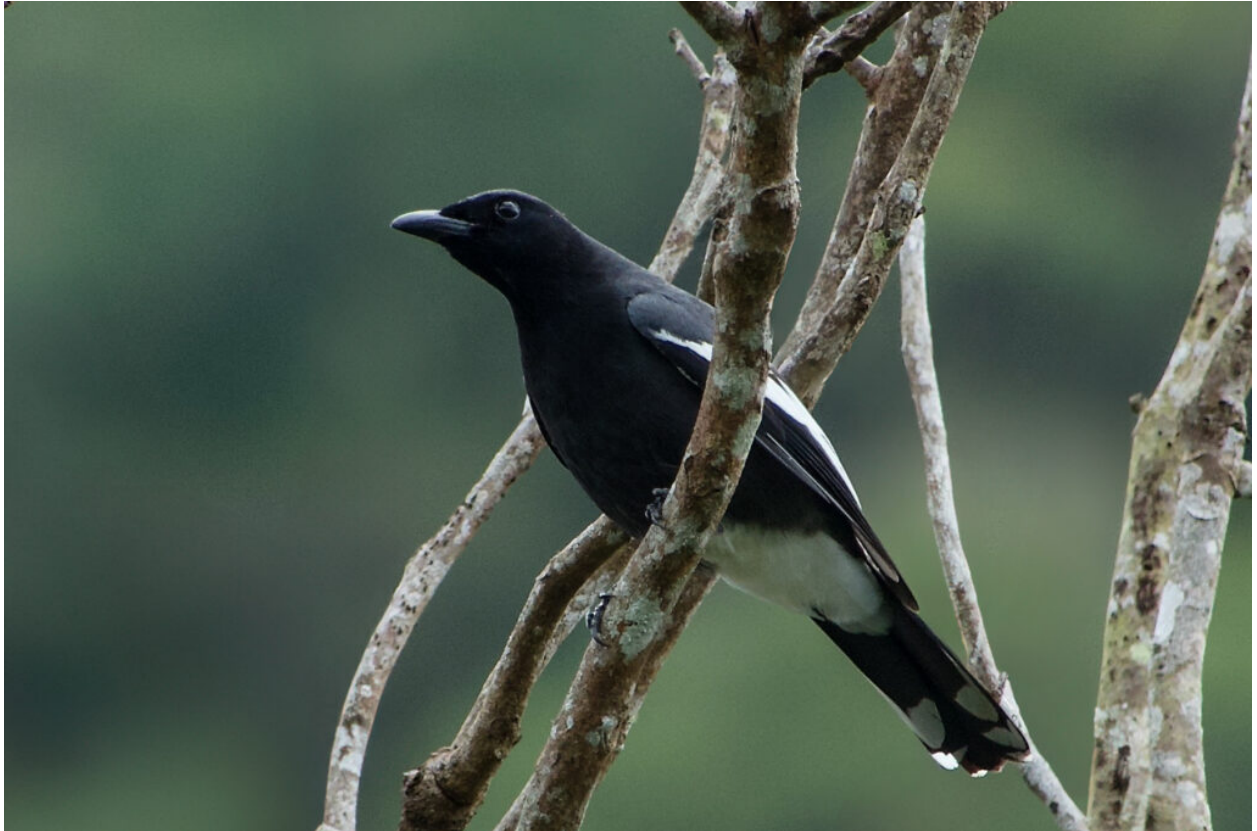
White-winged Cuckooshrike