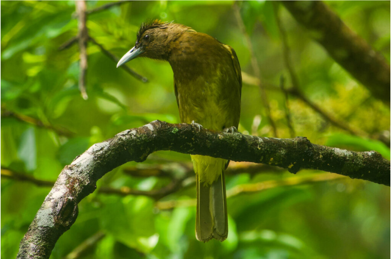
Camiguin Bulbul