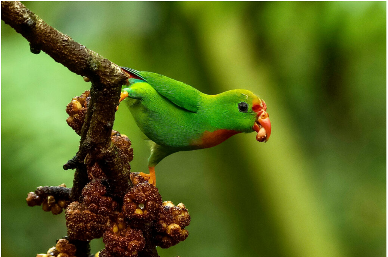
Philippine Hanging Parrot