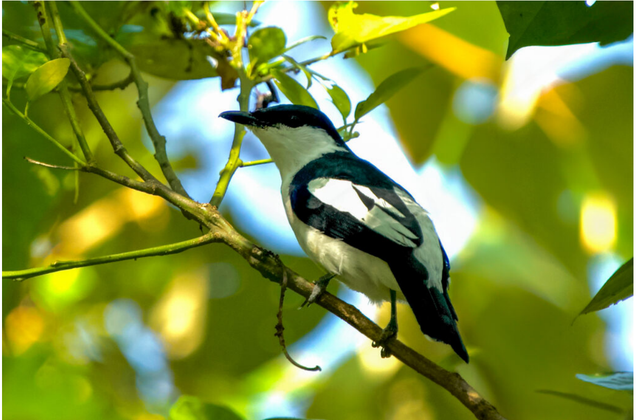
Northern Black-and-white Triller