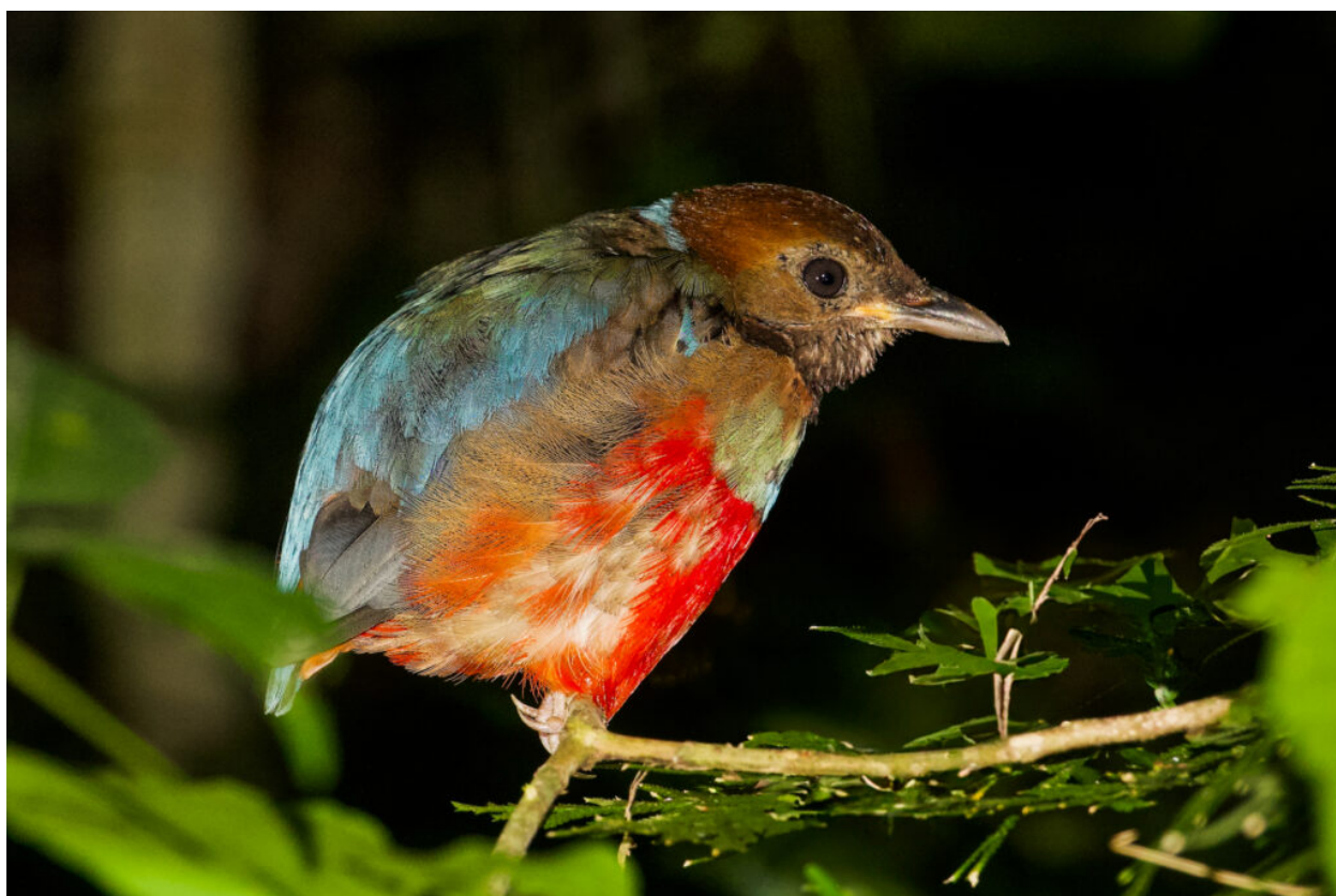
Philippine Pitta