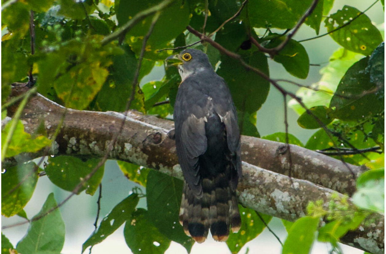
Philippine Hawk-Cuckoo