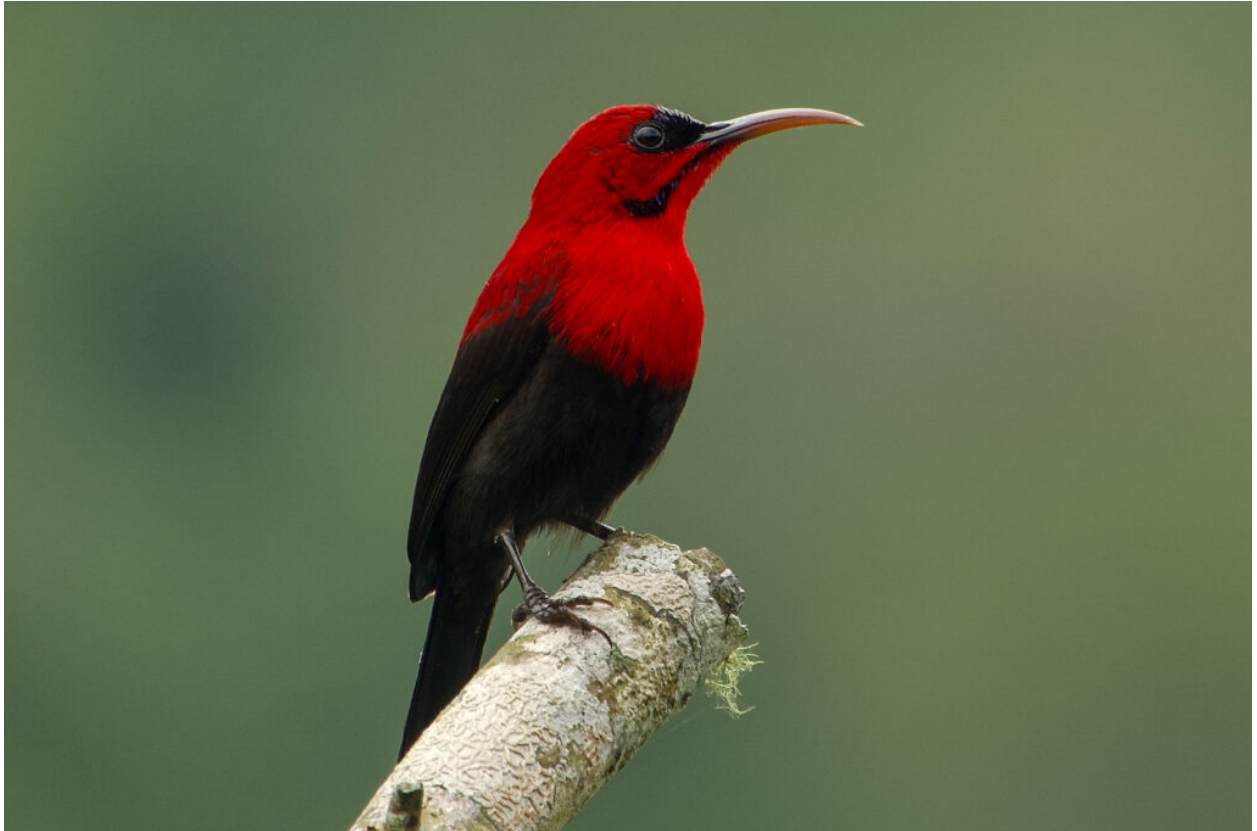
Magnificent Sunbird