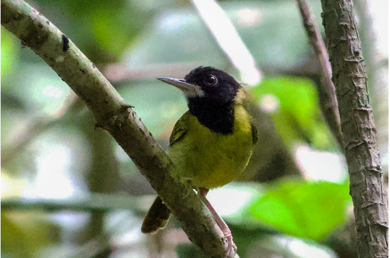
Yellow-breasted Tailorbird