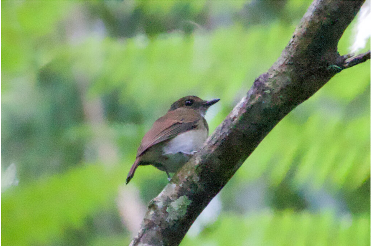
White-throated Jungle Flycatcher