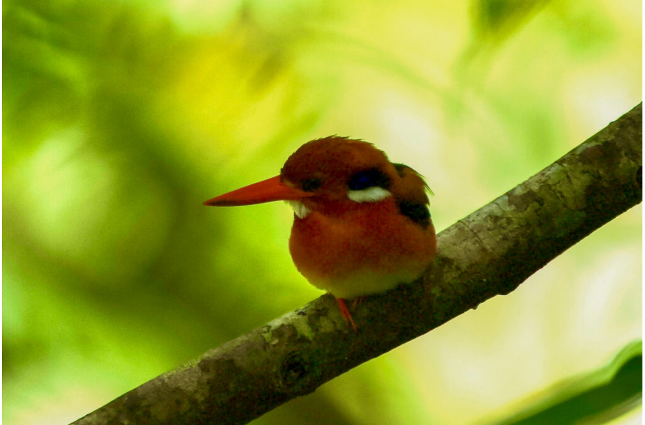
Philippine Dwarf Kingfisher