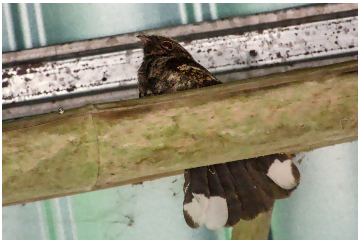
Philippine Nightjar