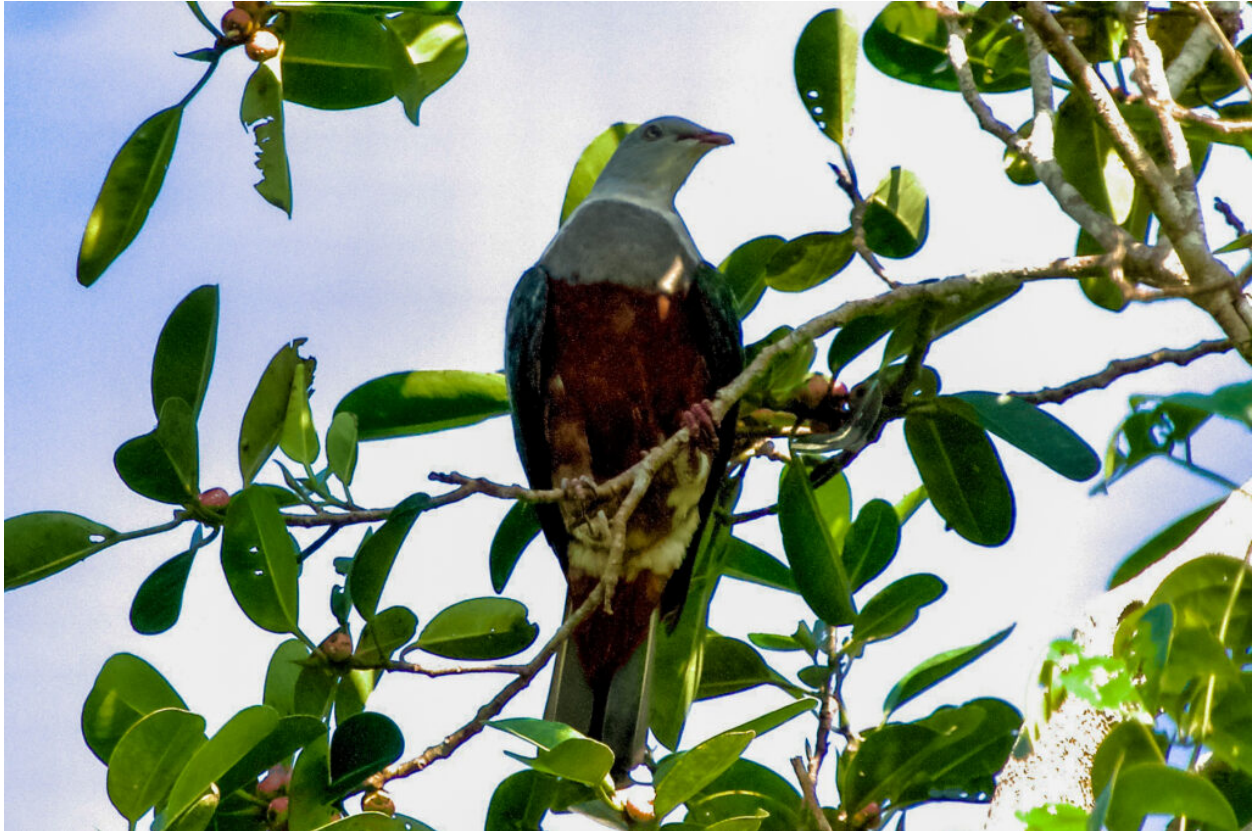
Spotted Imperial Pigeon

Chalky Percher Diplacodes trivialis Bohol.