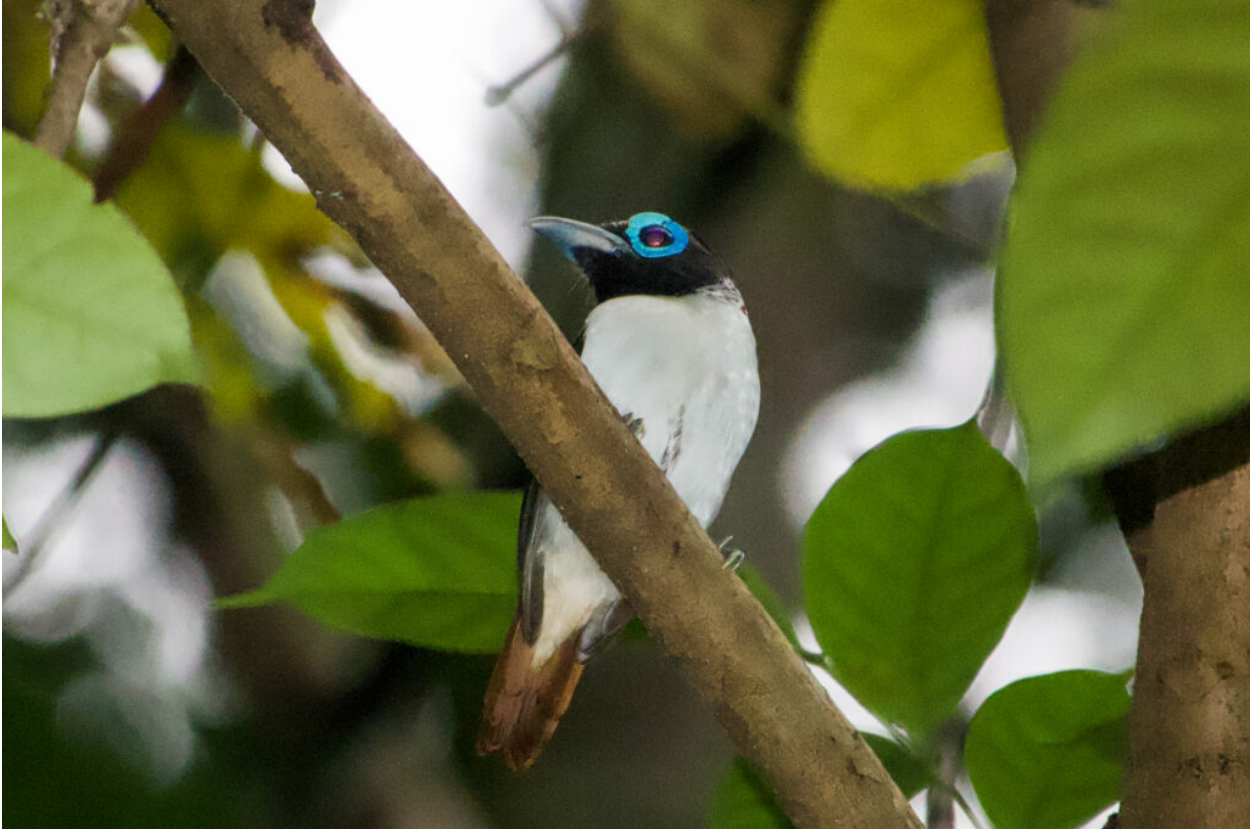
Visayan Broadbill