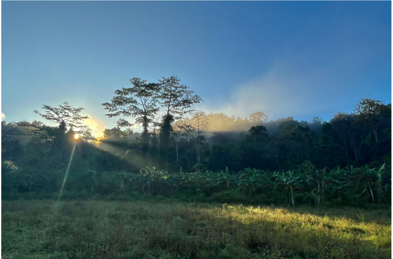
Forest edge