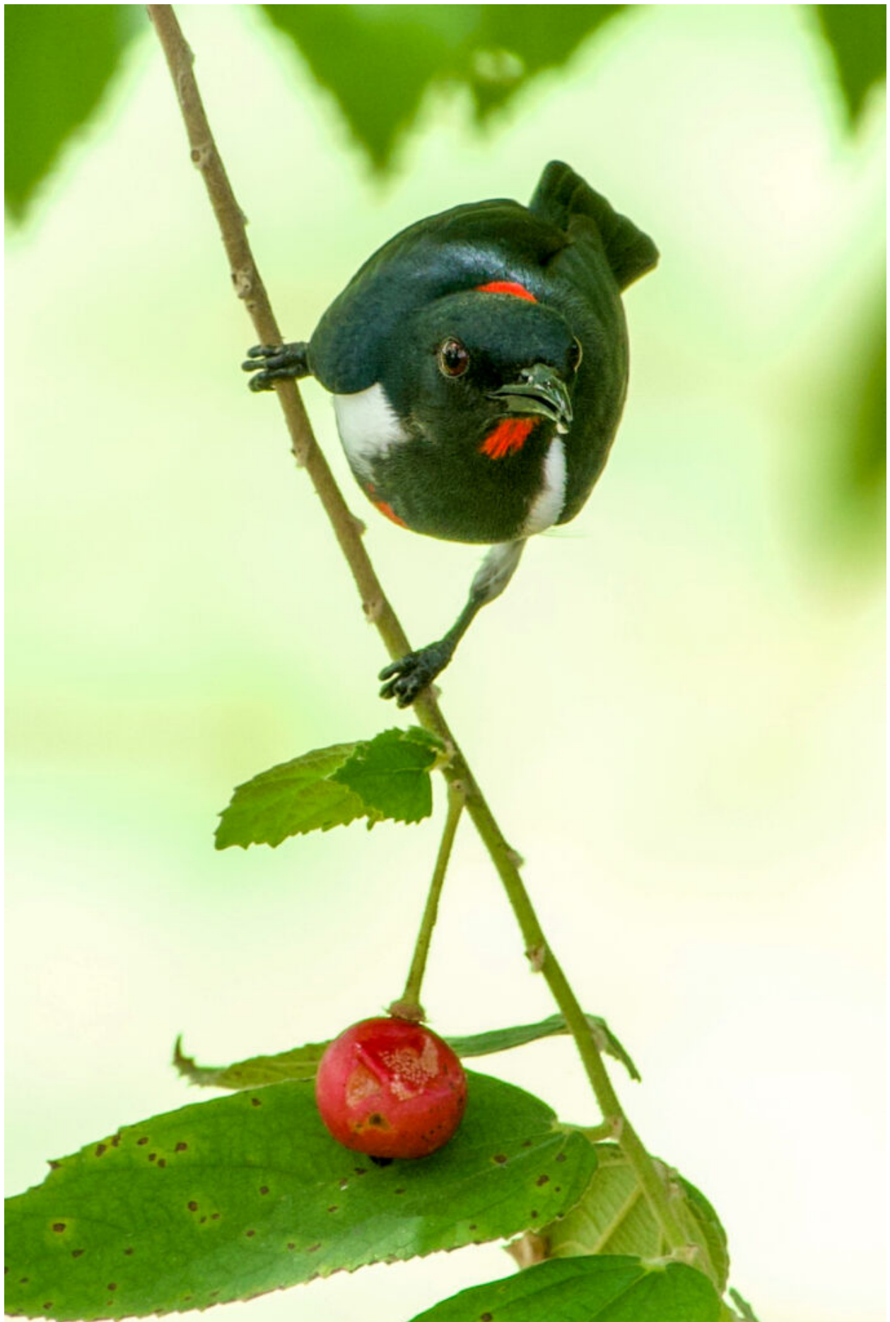
Scarlet-collared Flowerpecker