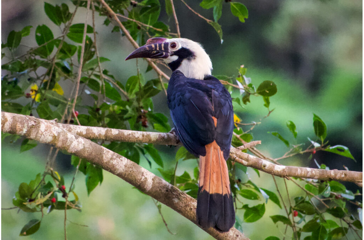
Visayan Hornbill