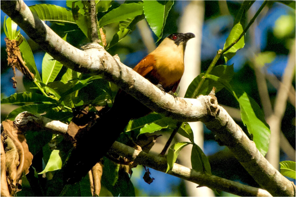
Black-faced Coucal