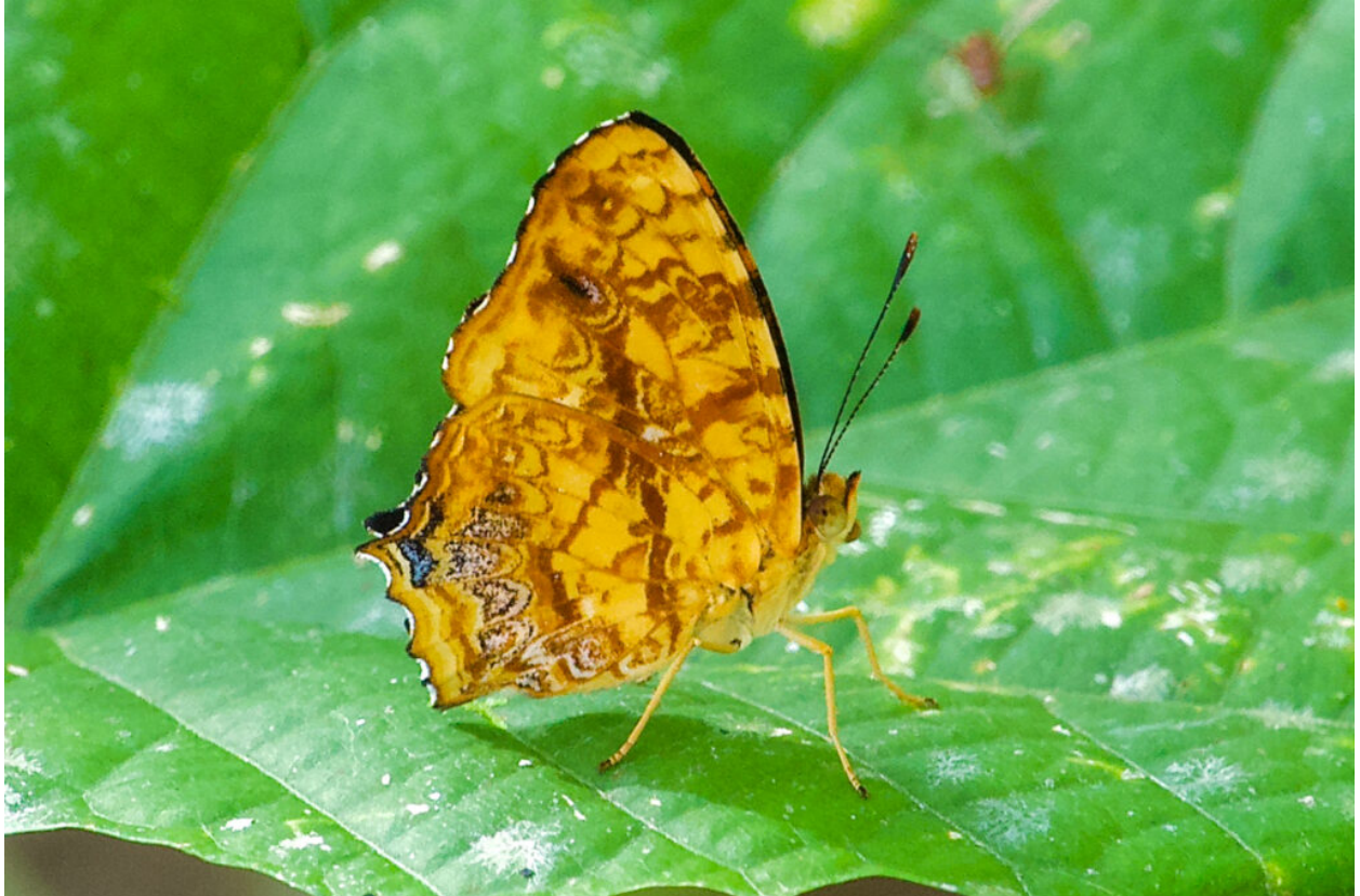
Common Jester (image by Craig Robson)