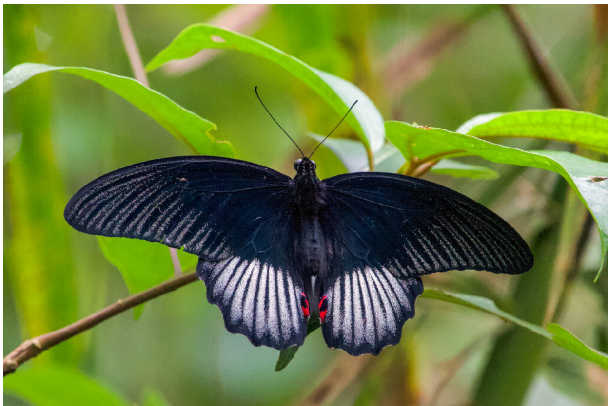
Scarlet Mormon (image by Craig Robson)