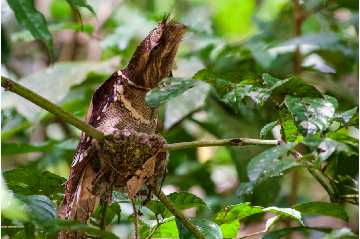
Philippine Frogmouth