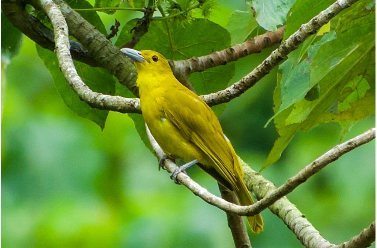
Isabela Oriole