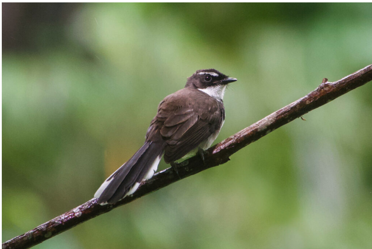
Philippine Pied Fantail