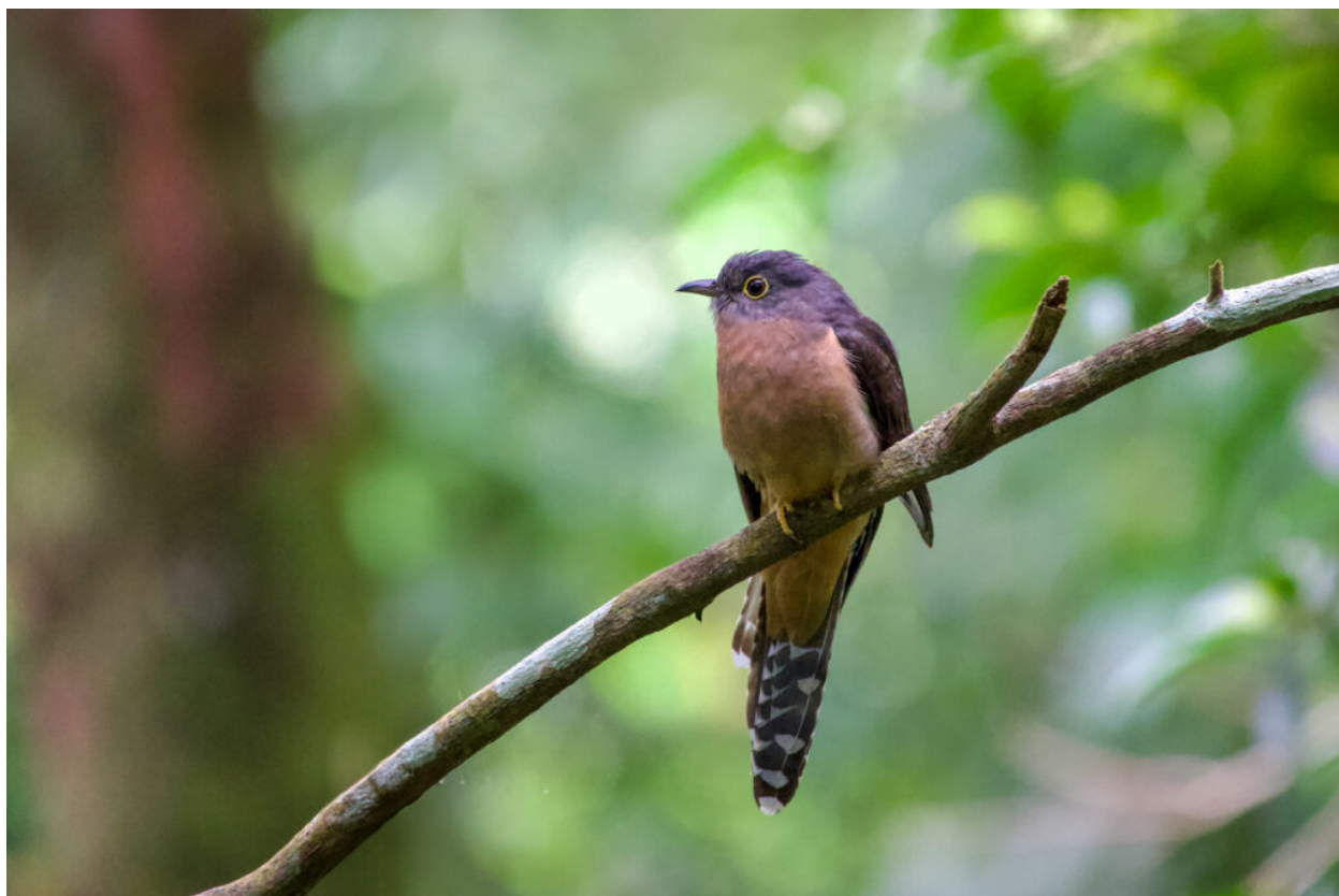
Sunda Brush Cuckoo