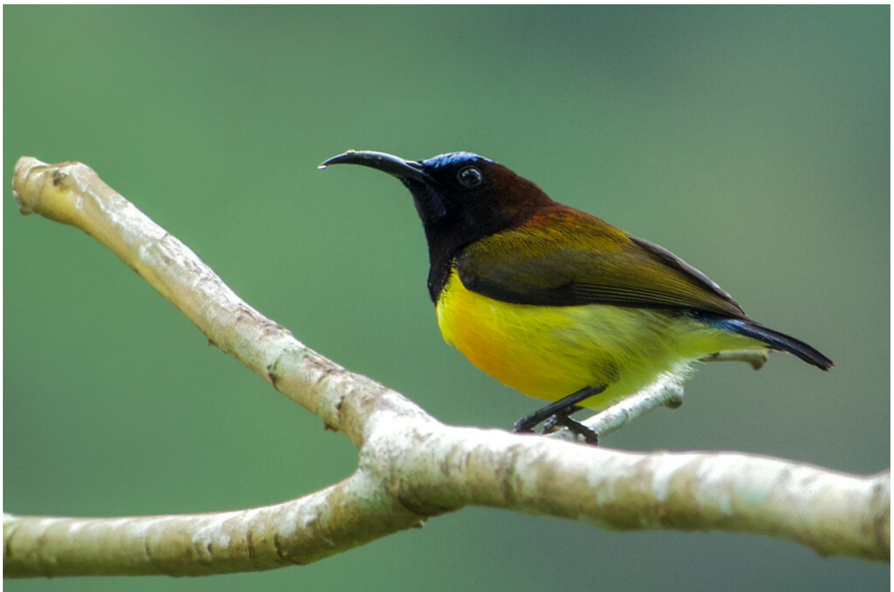
Maroon-naped Sunbird