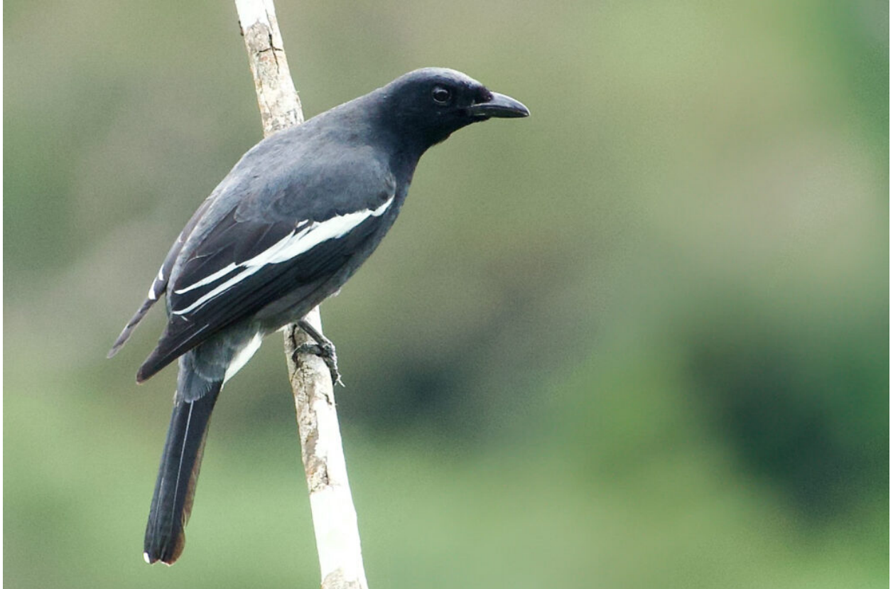
White-winged Cuckooshrike