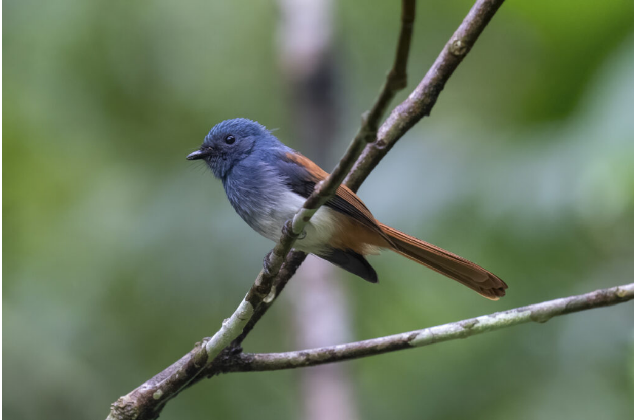
Visayan Fantail