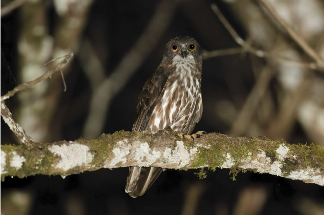
Chocolate Boobook