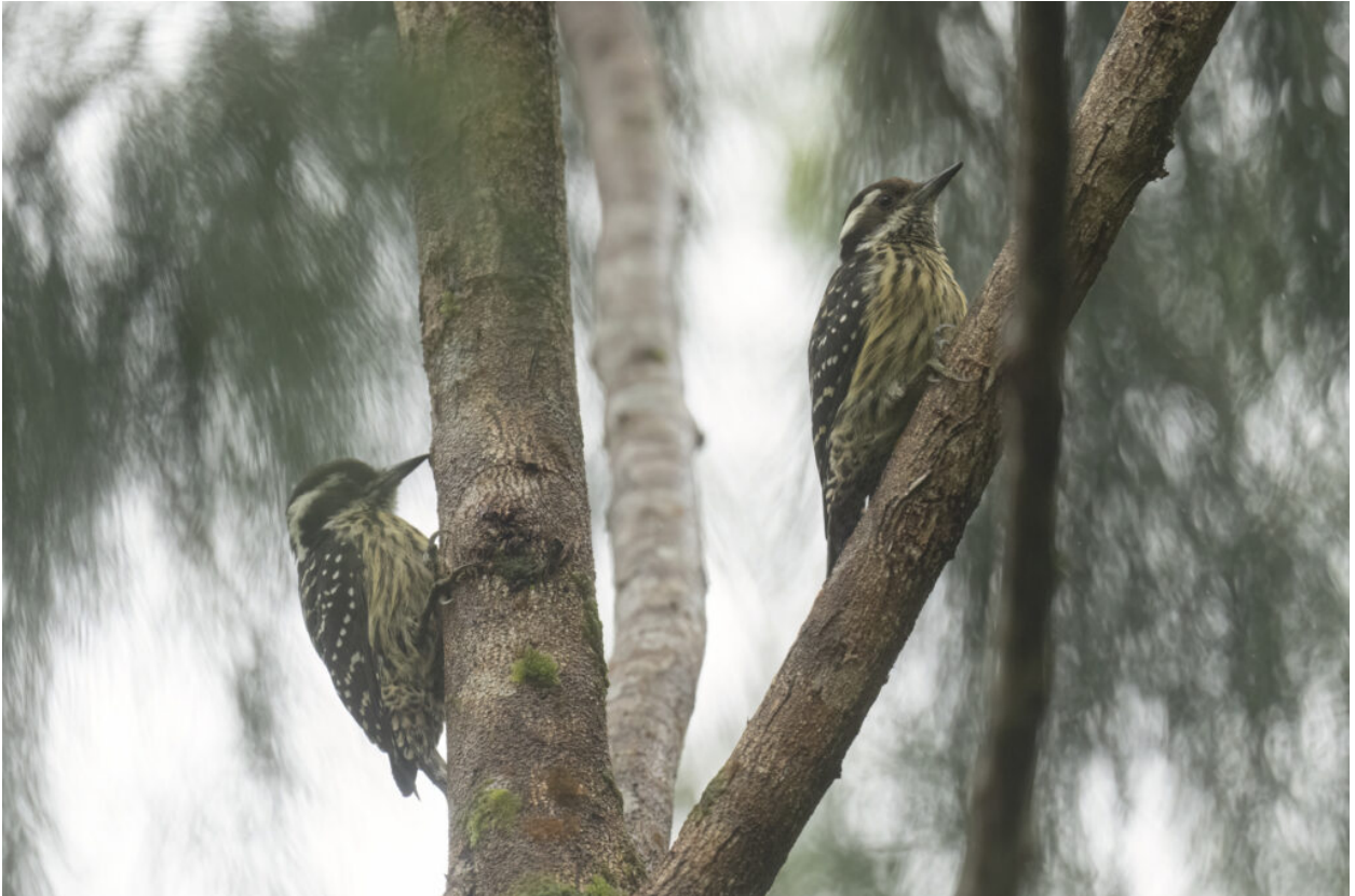
Philippine Pygmy Woodpeckers