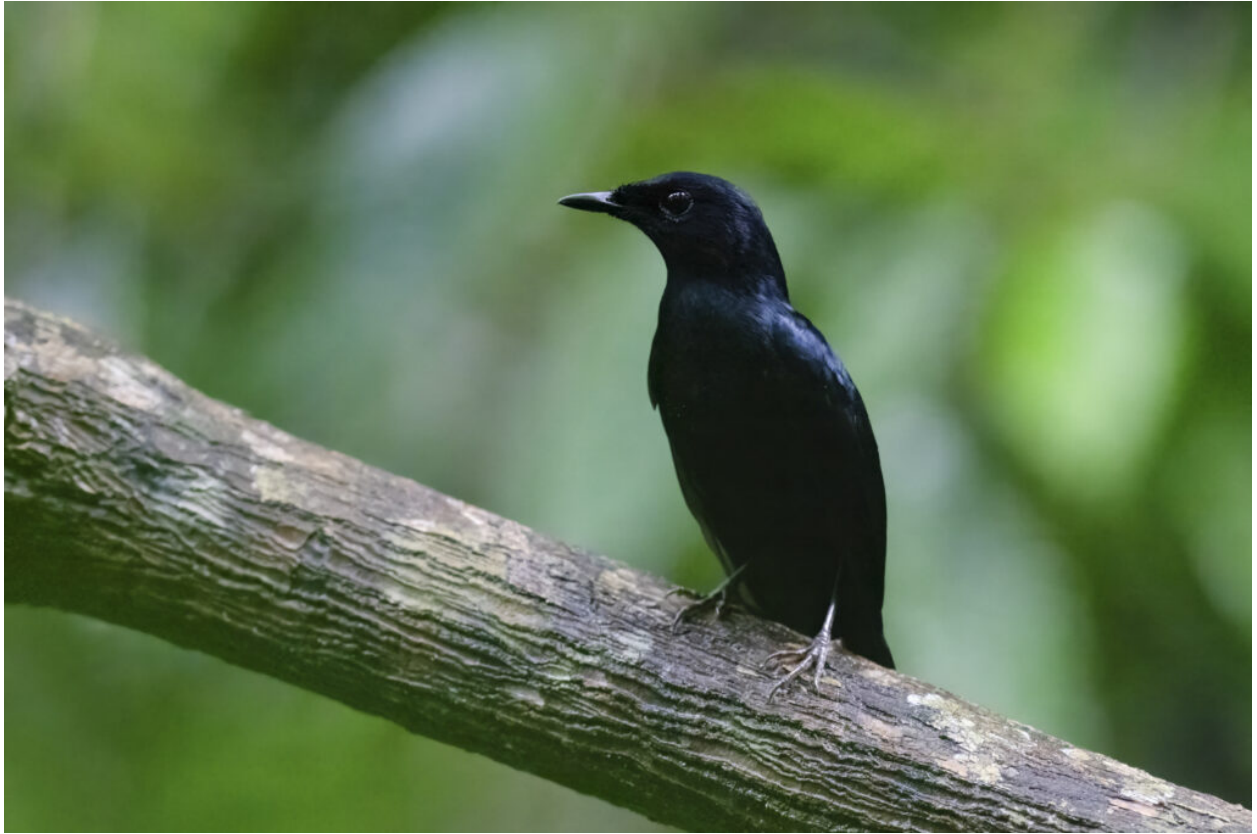
Black Shama