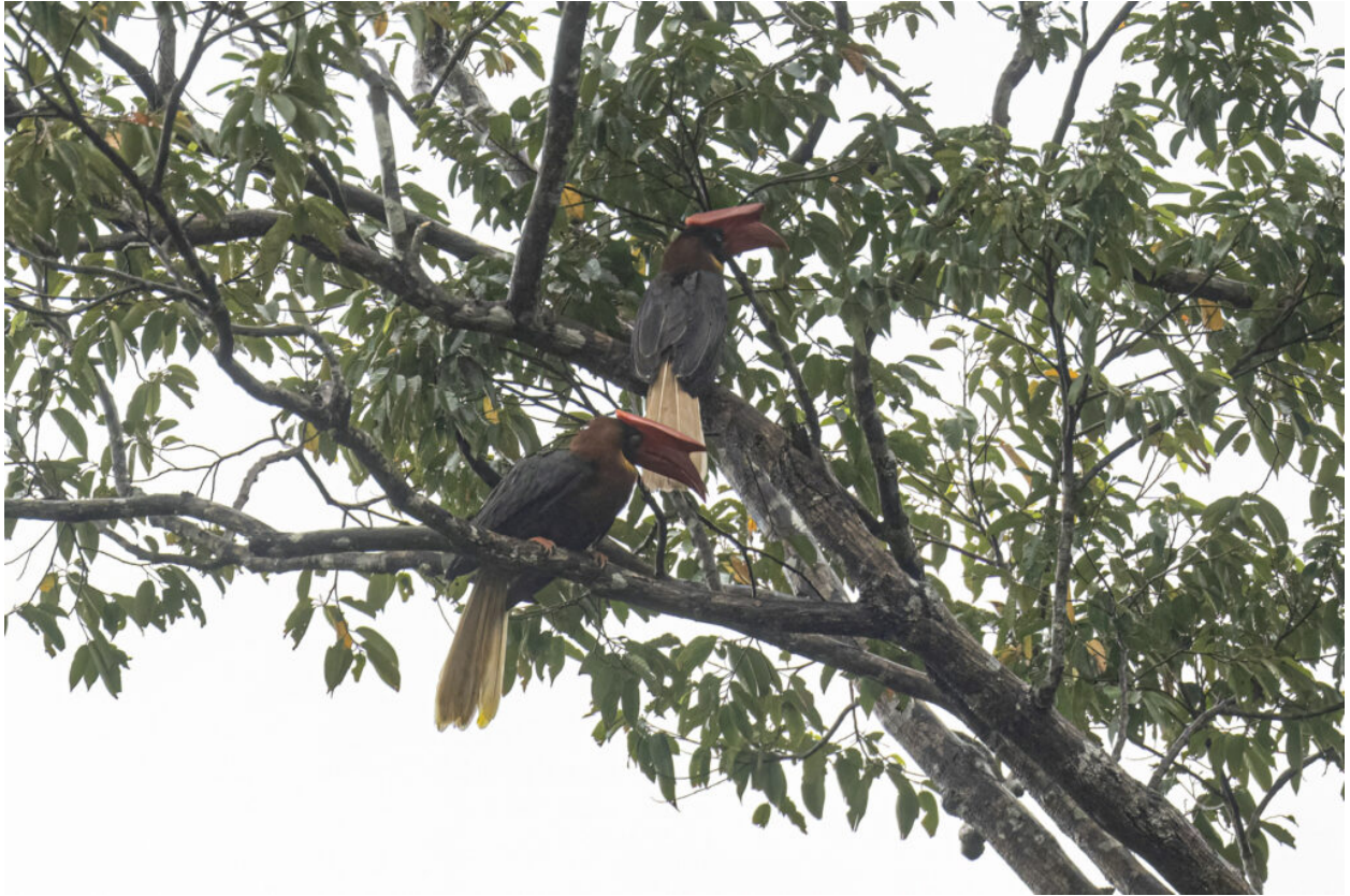
Northern Rufous Hornbills