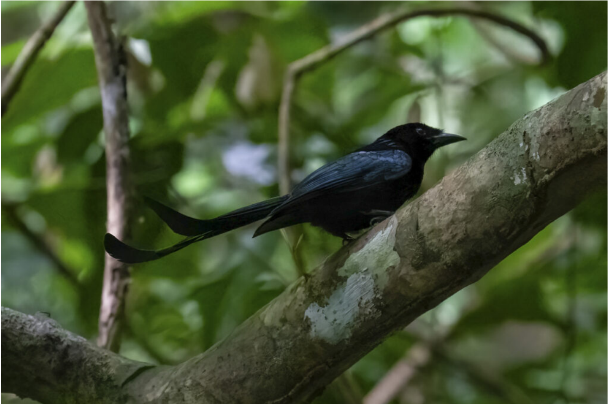
Tablas Drongo