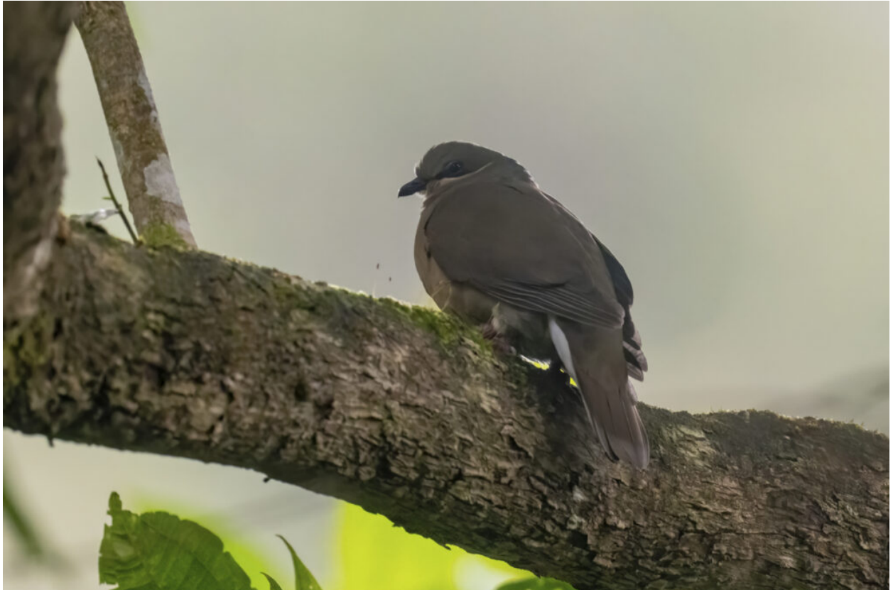
Buff-eared Brown Dove