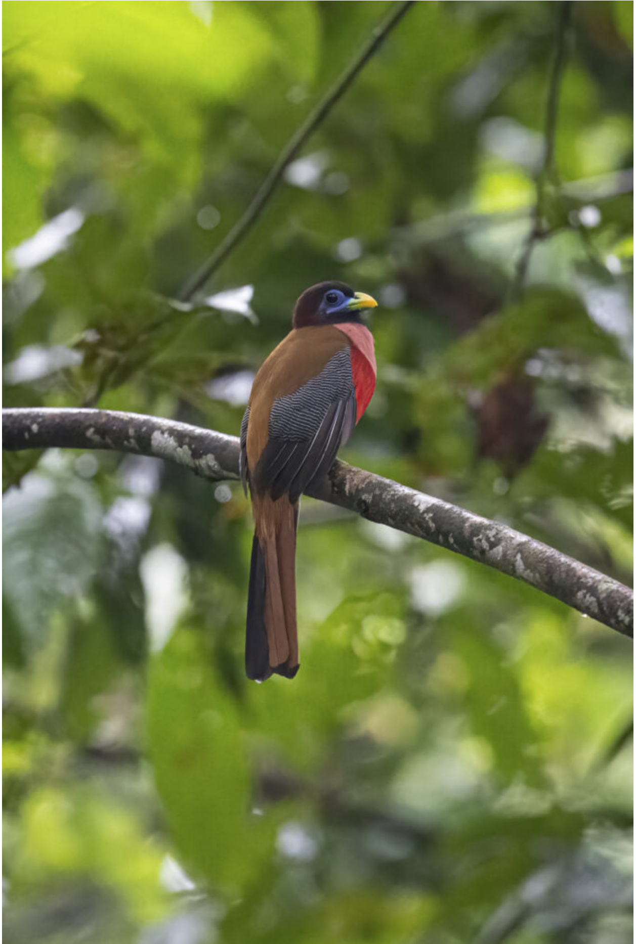
Philippine Trogon