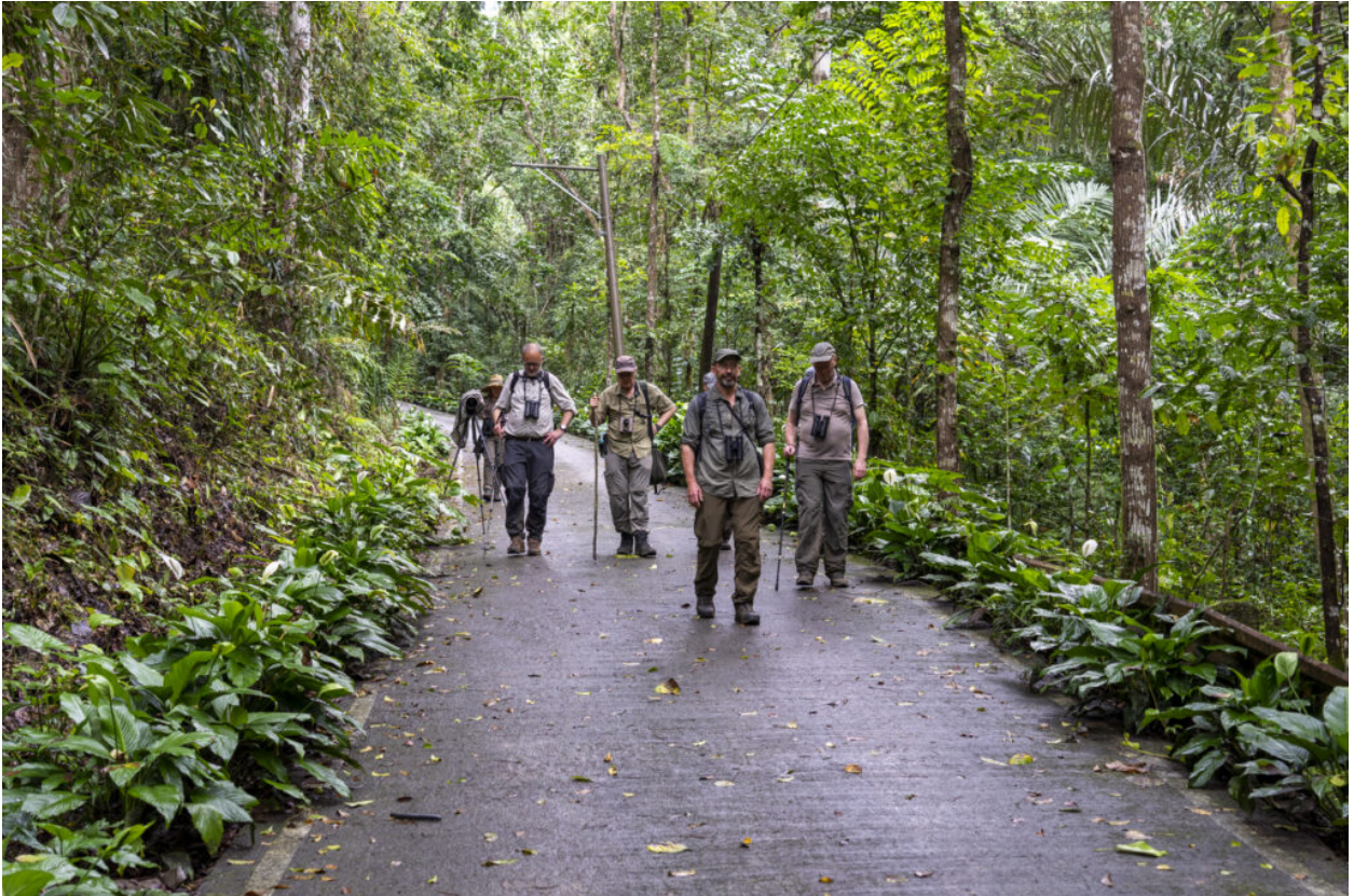
Bohol birding