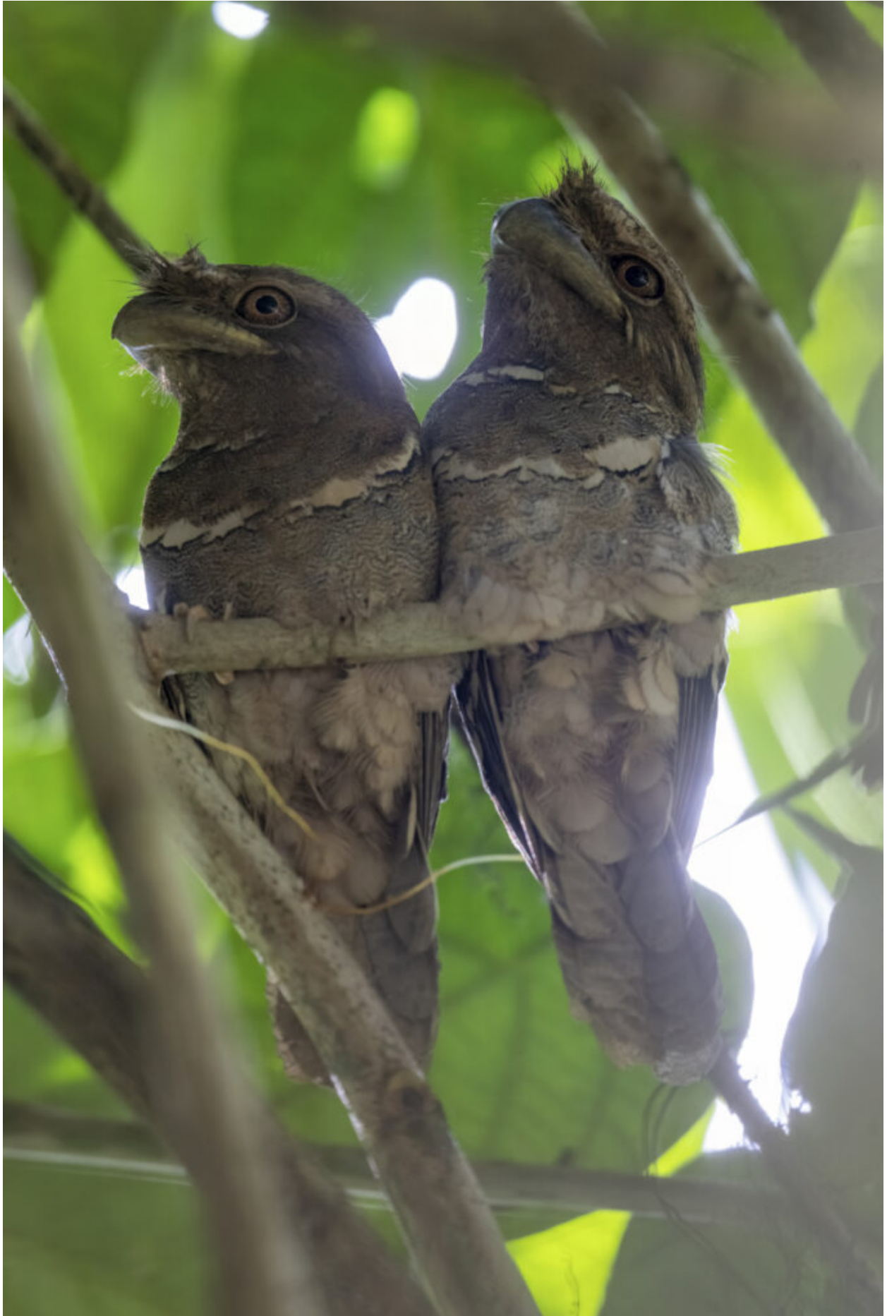
Philippine Frogmouths