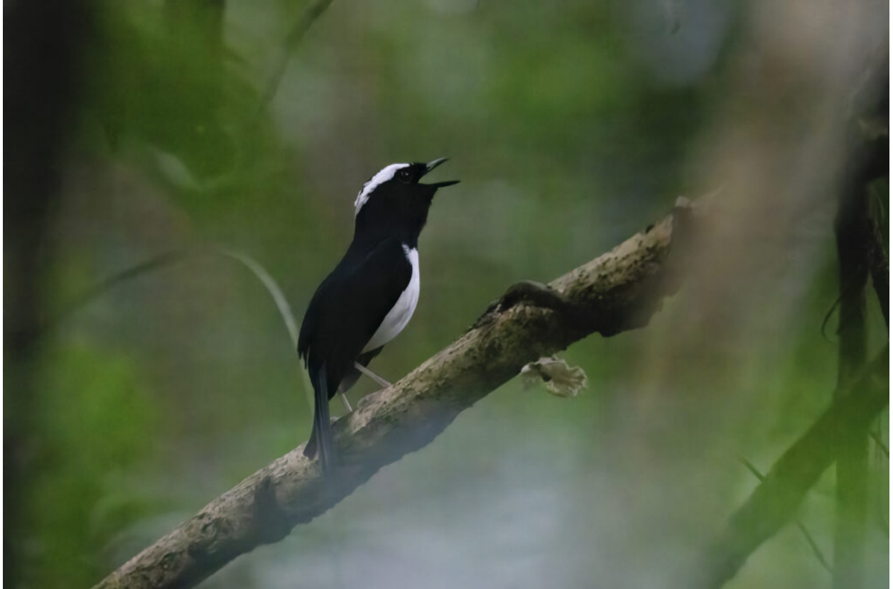
Visayan Shama