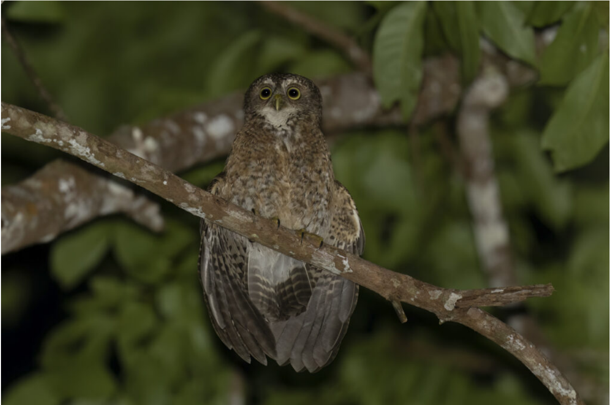
Cebu Boobook