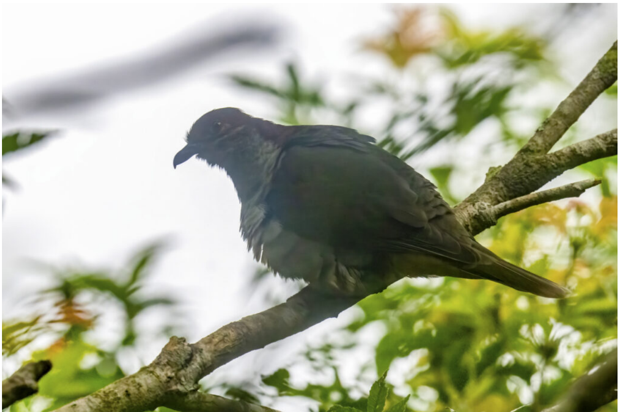
Grey-breasted Brown Dove