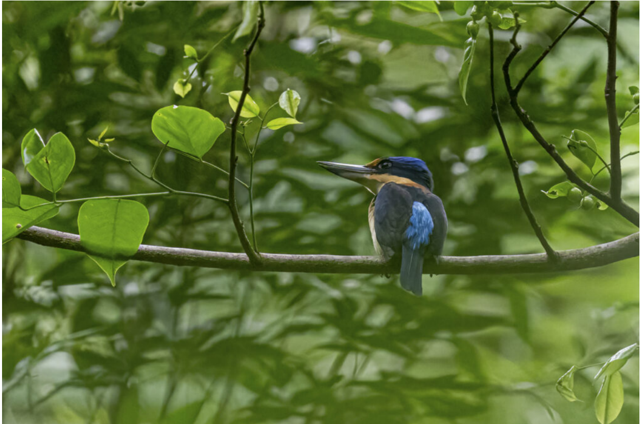
Winchell's Kingfisher