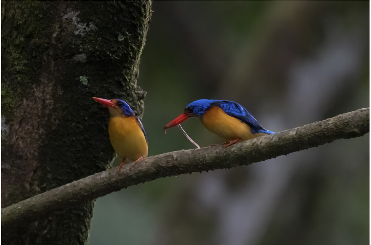
Dimorphic Dwarf Kingfishers courting