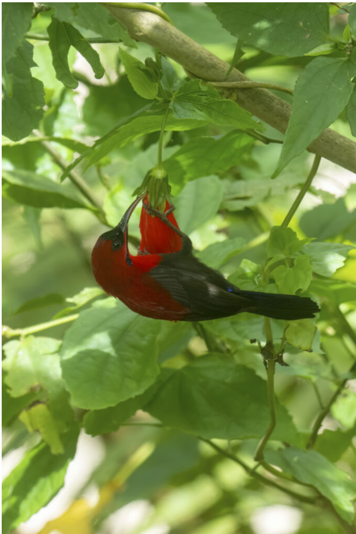
Magnificent Sunbird