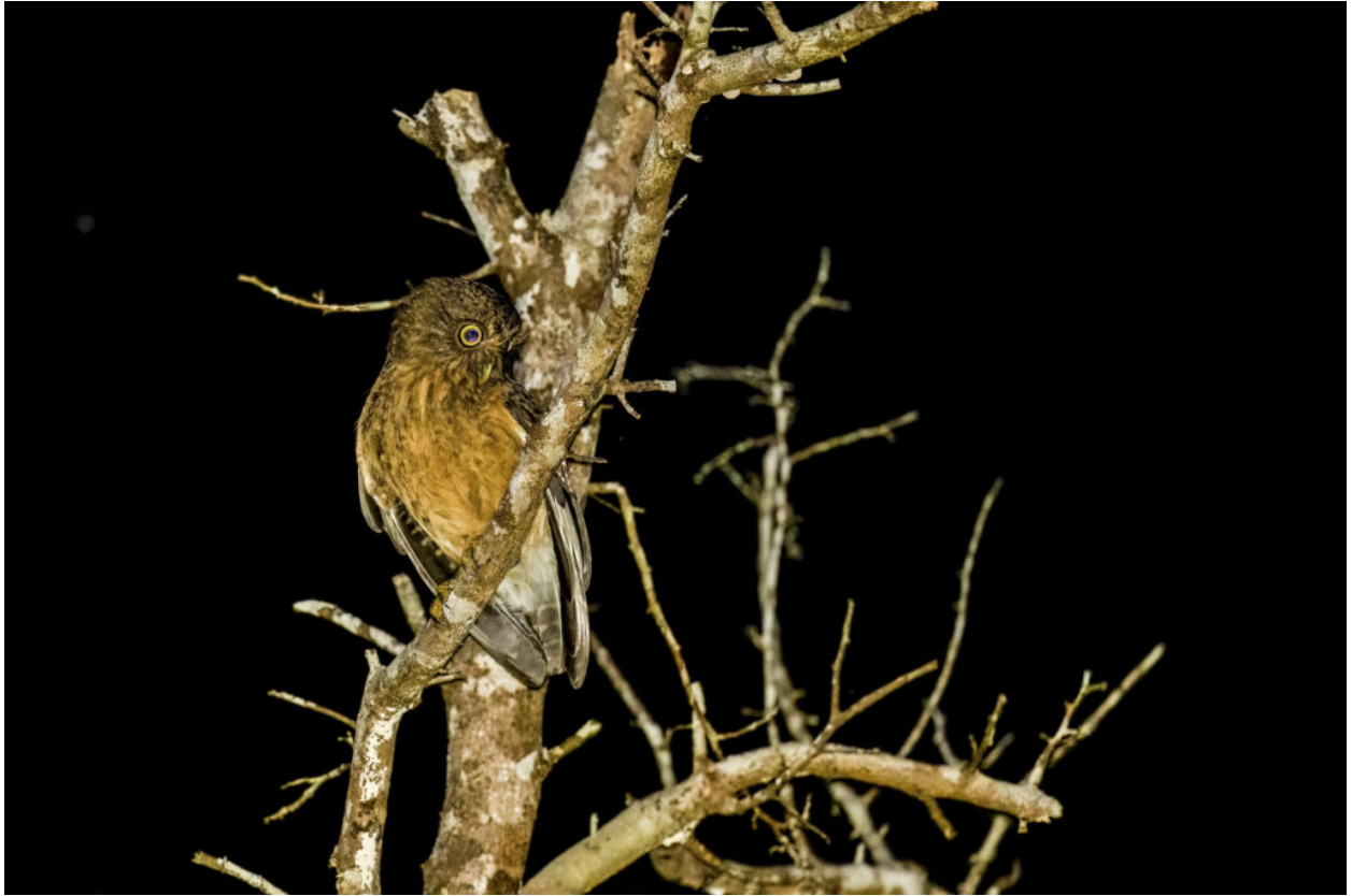
Romblon Boobook