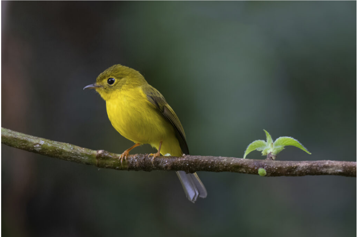
Citrine Canary-flycatcher