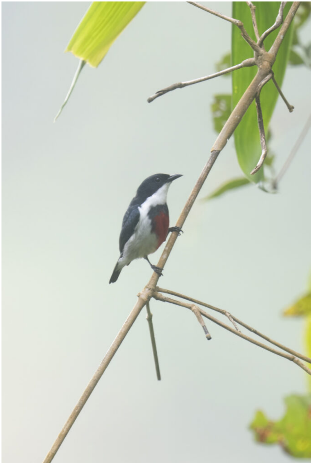
Black-belted Flowerpecker