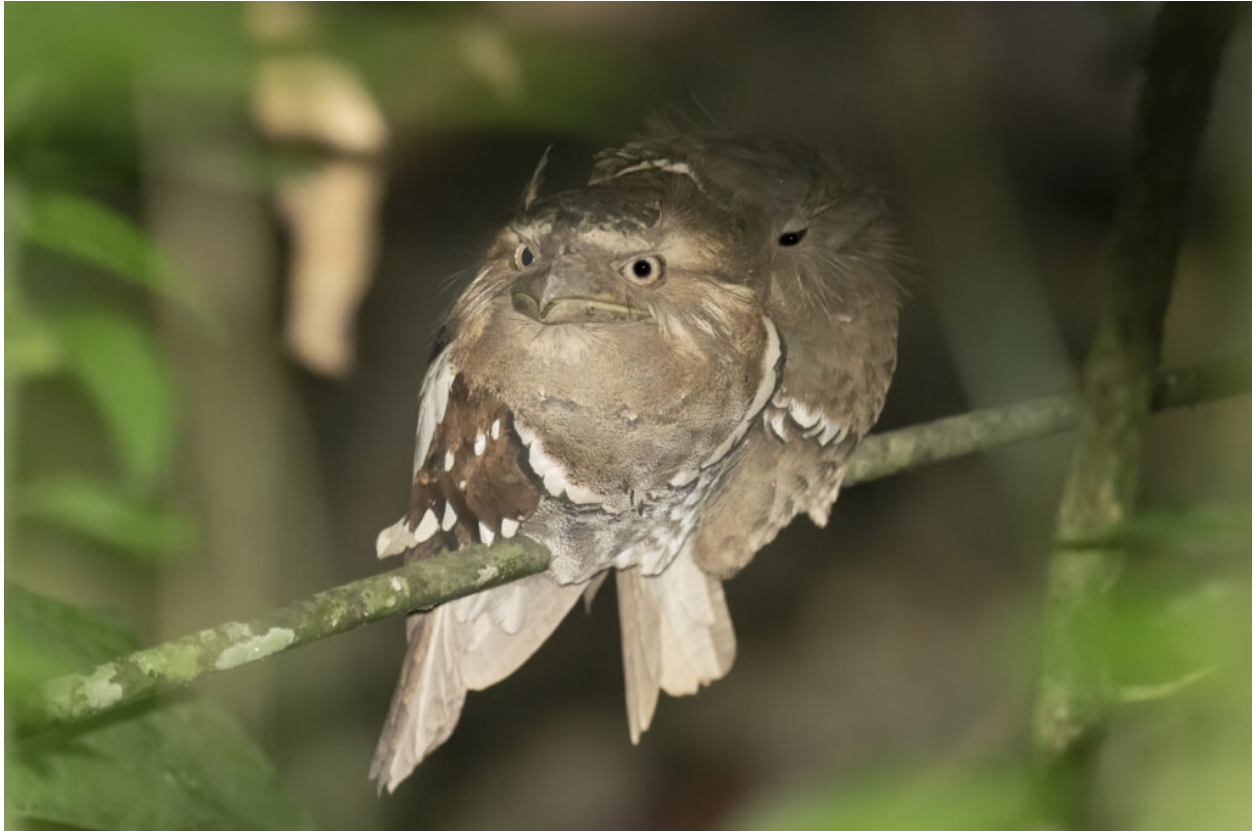
Philippine Frogmouths