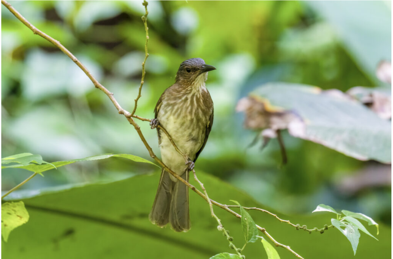
Streak-breasted Bulbul of the Tablas form (image by Mark Beaman)