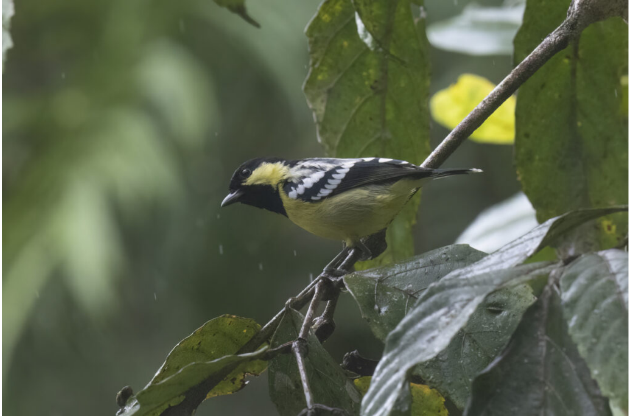
Elegant Tit