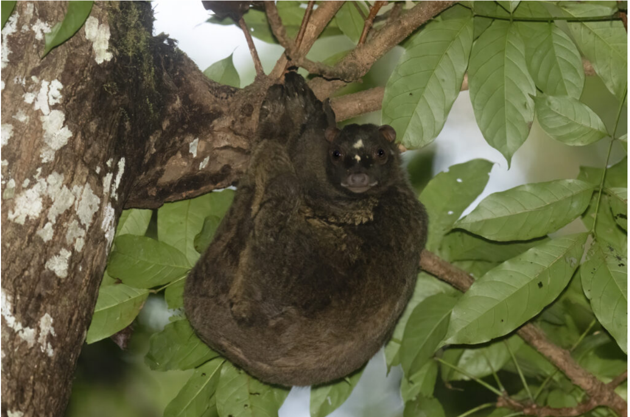
Philippine Flying Lemur or Colugo