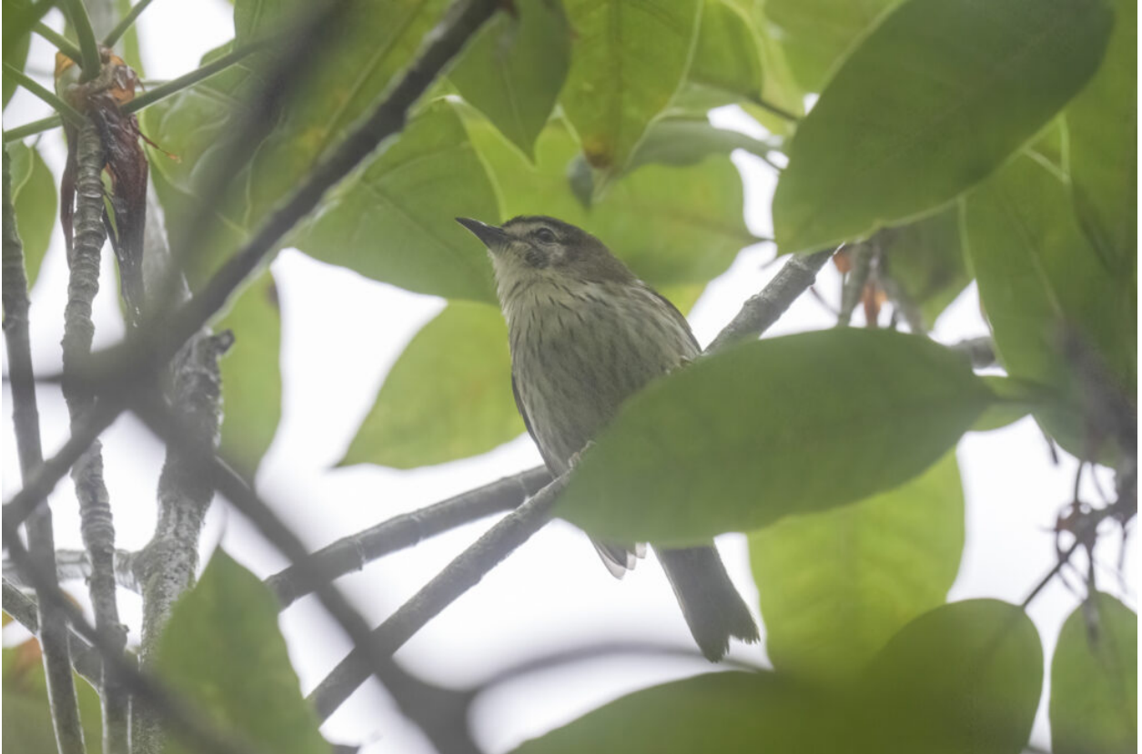
Negros Striped Babbler