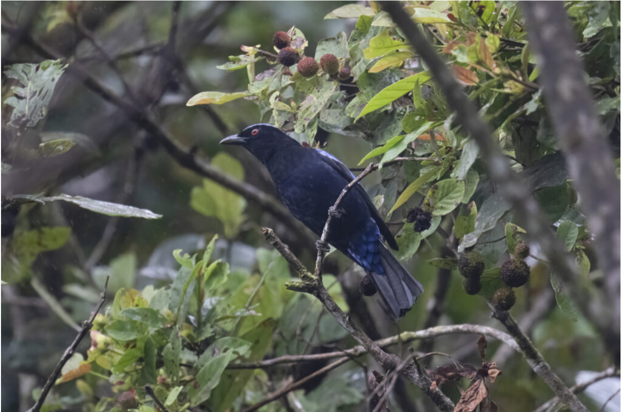
Philippine Fairy-bluebird