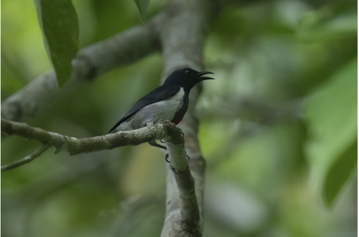
Scarlet-collared Flowerpecker