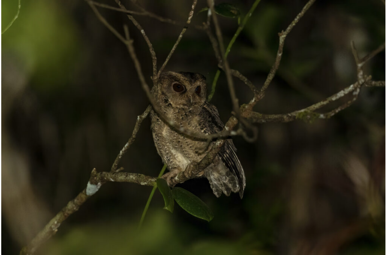
Philippine Scops Owl