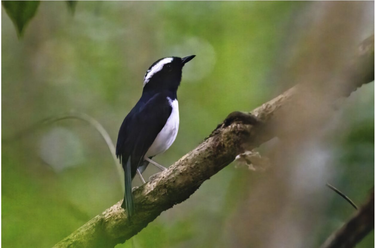
Visayan Shama