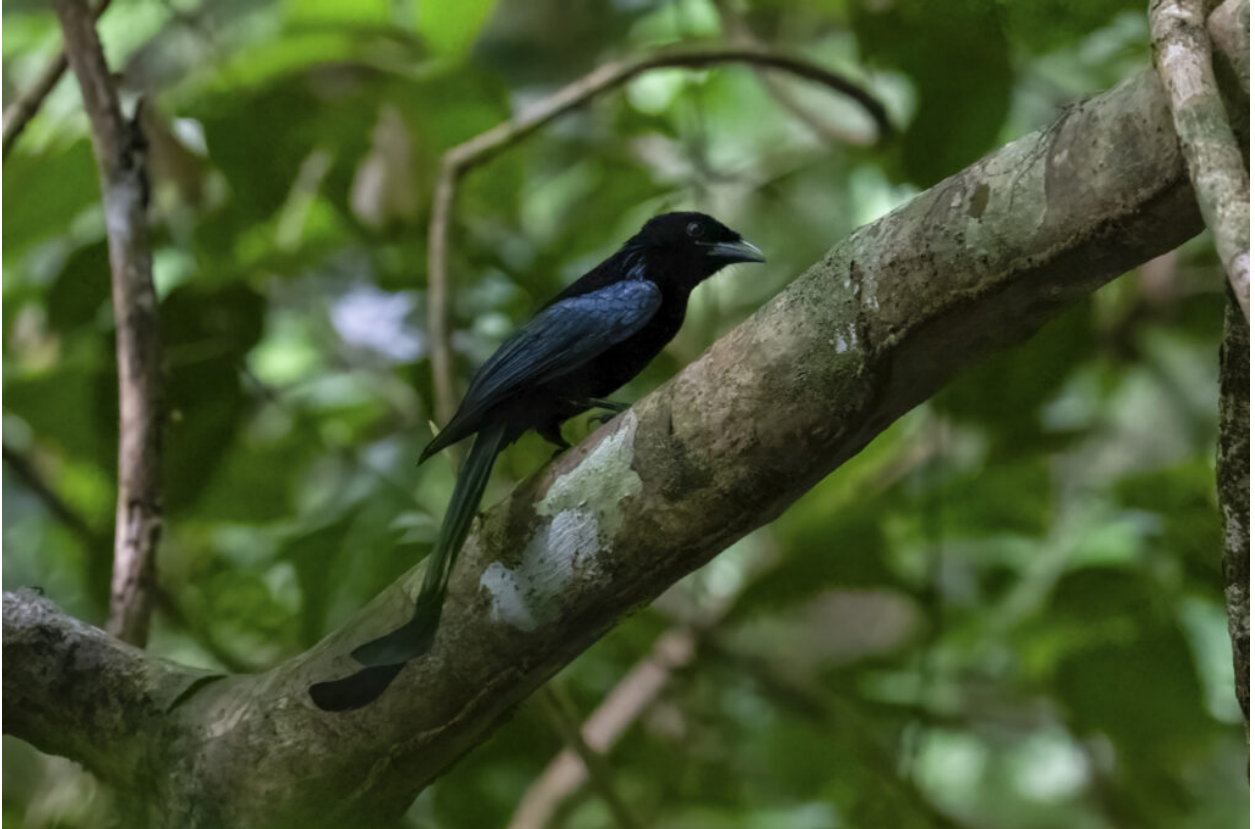
Tablas Drongo