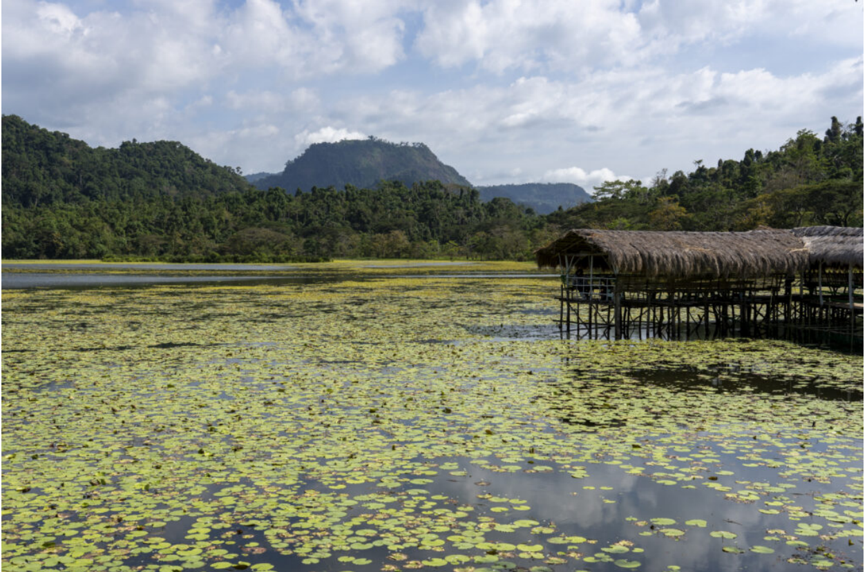
Mindoro is a beautiful island