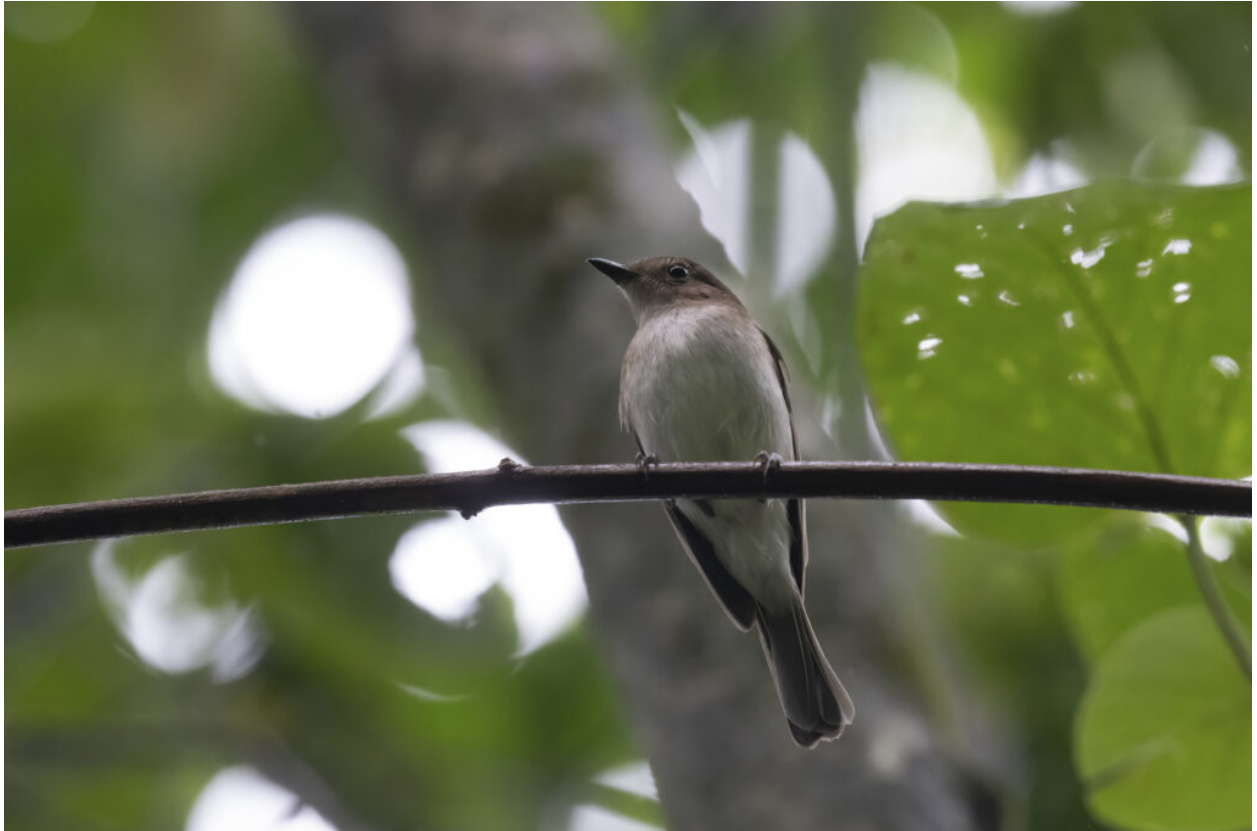
White-vented Whistler