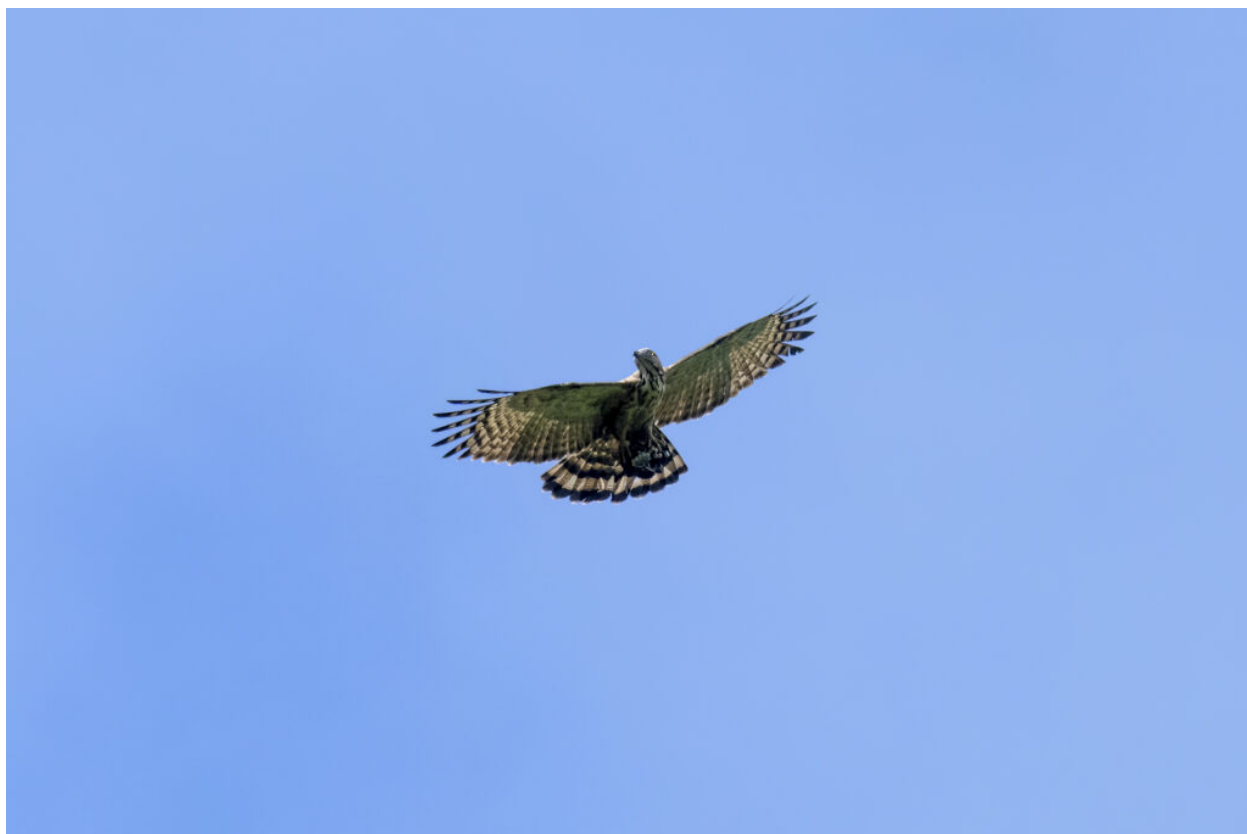
Philippine Honey Buzzard