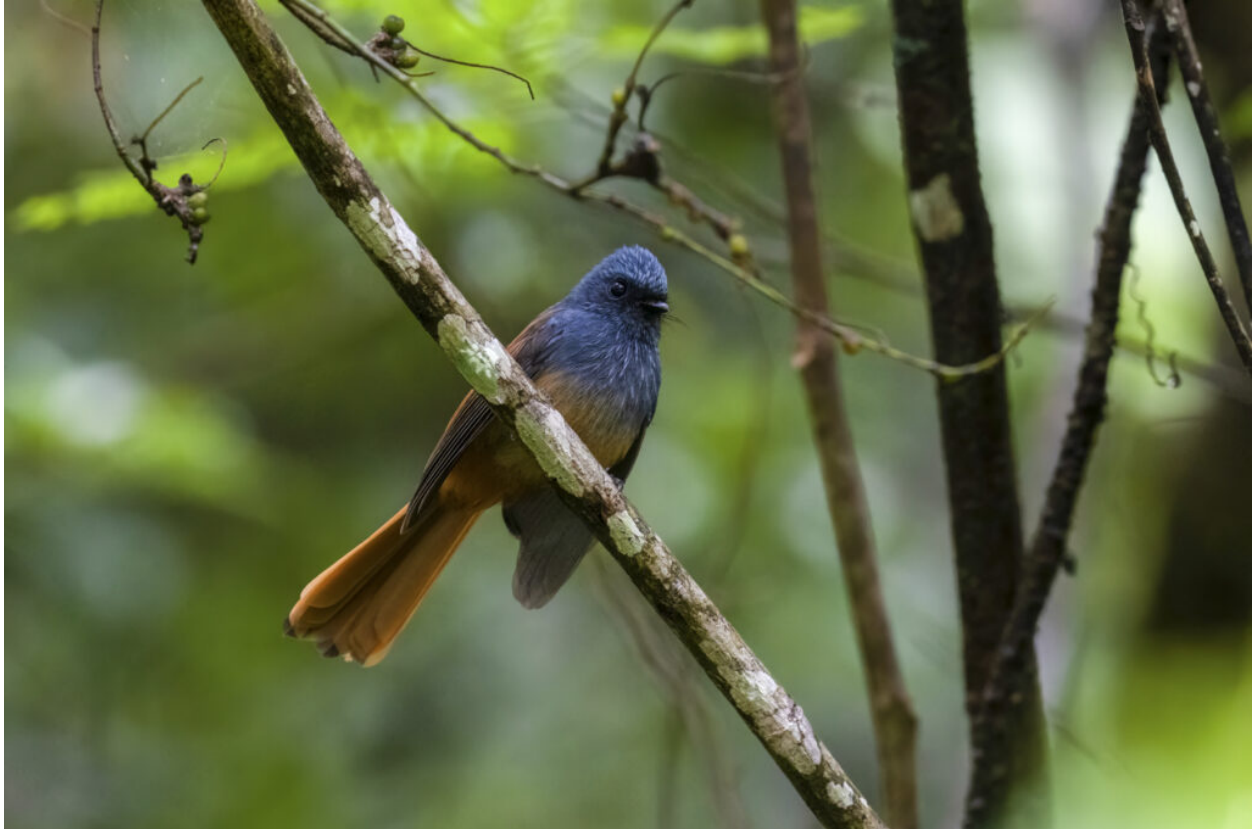
Tablas Fantail