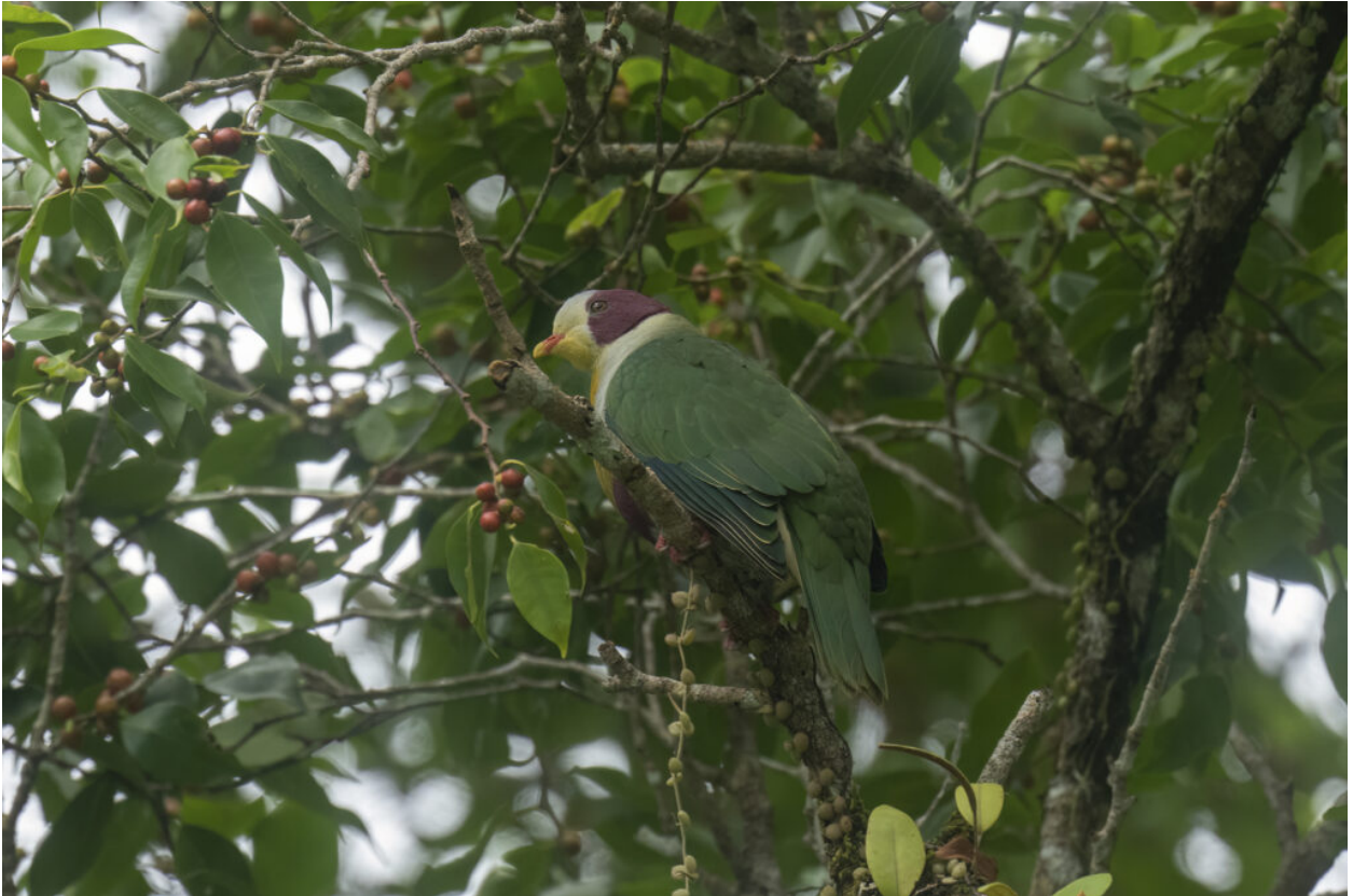
Yellow-breasted Fruit Dove