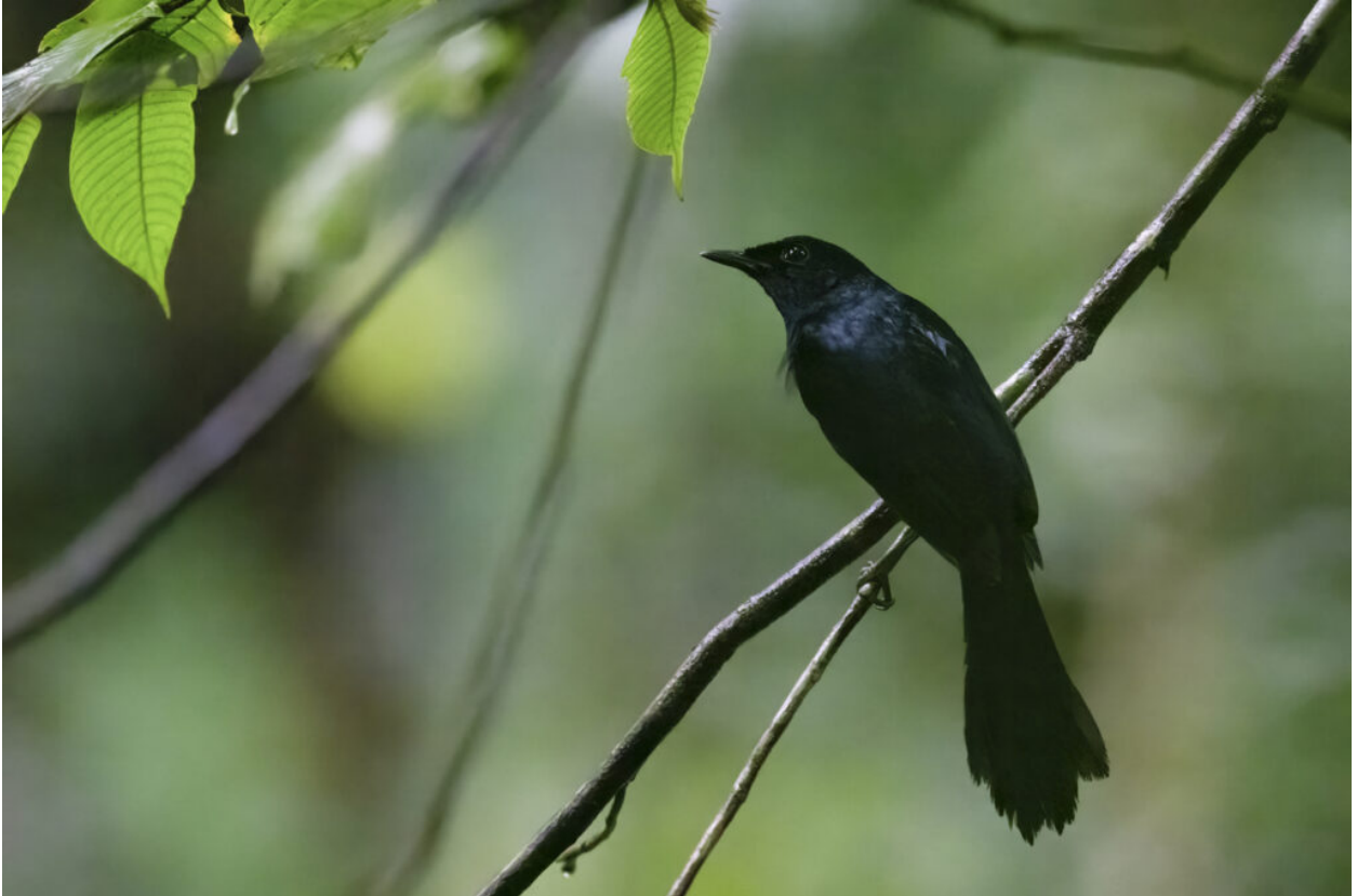
Black Shama