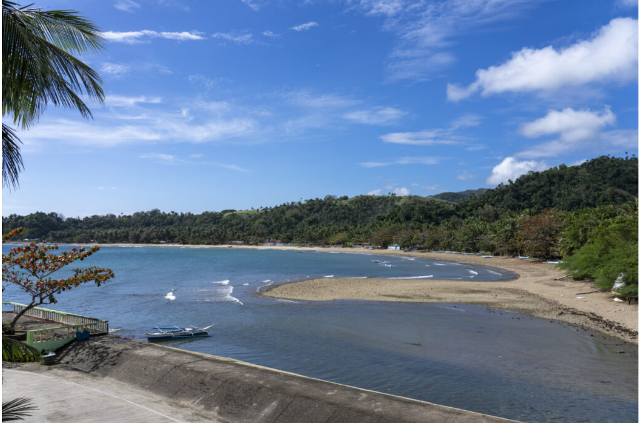
The attractive coastline of Tablas Island