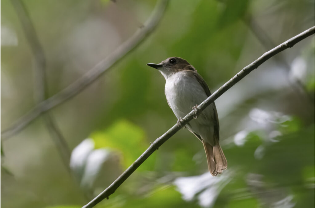
Philippine Jungle Flycatcher