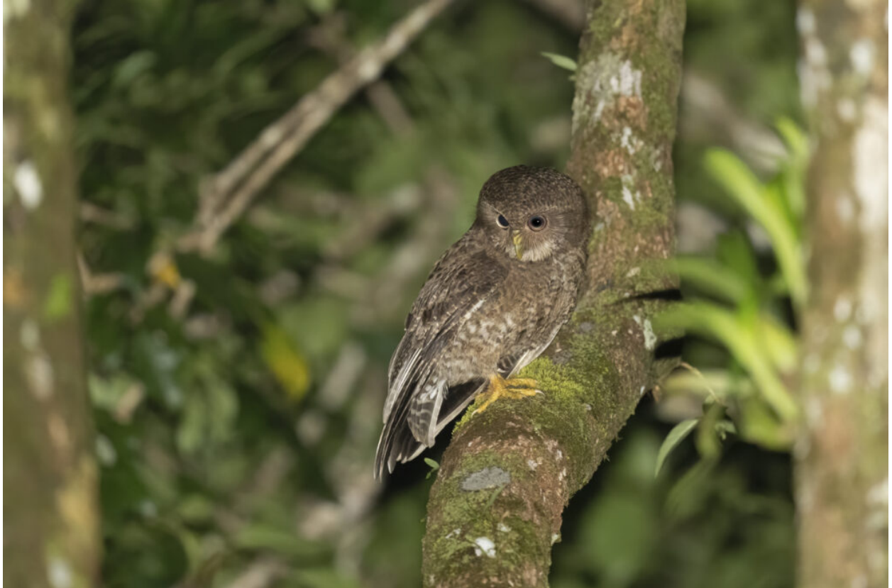
Camiguin Boobook