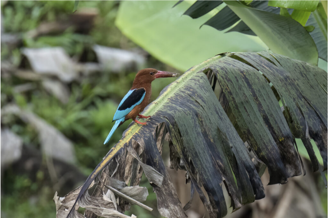
White-throated Kingfisher