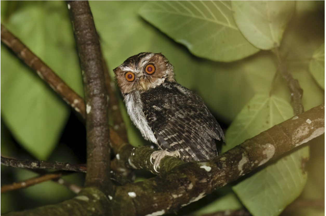
Negros Scops Owl