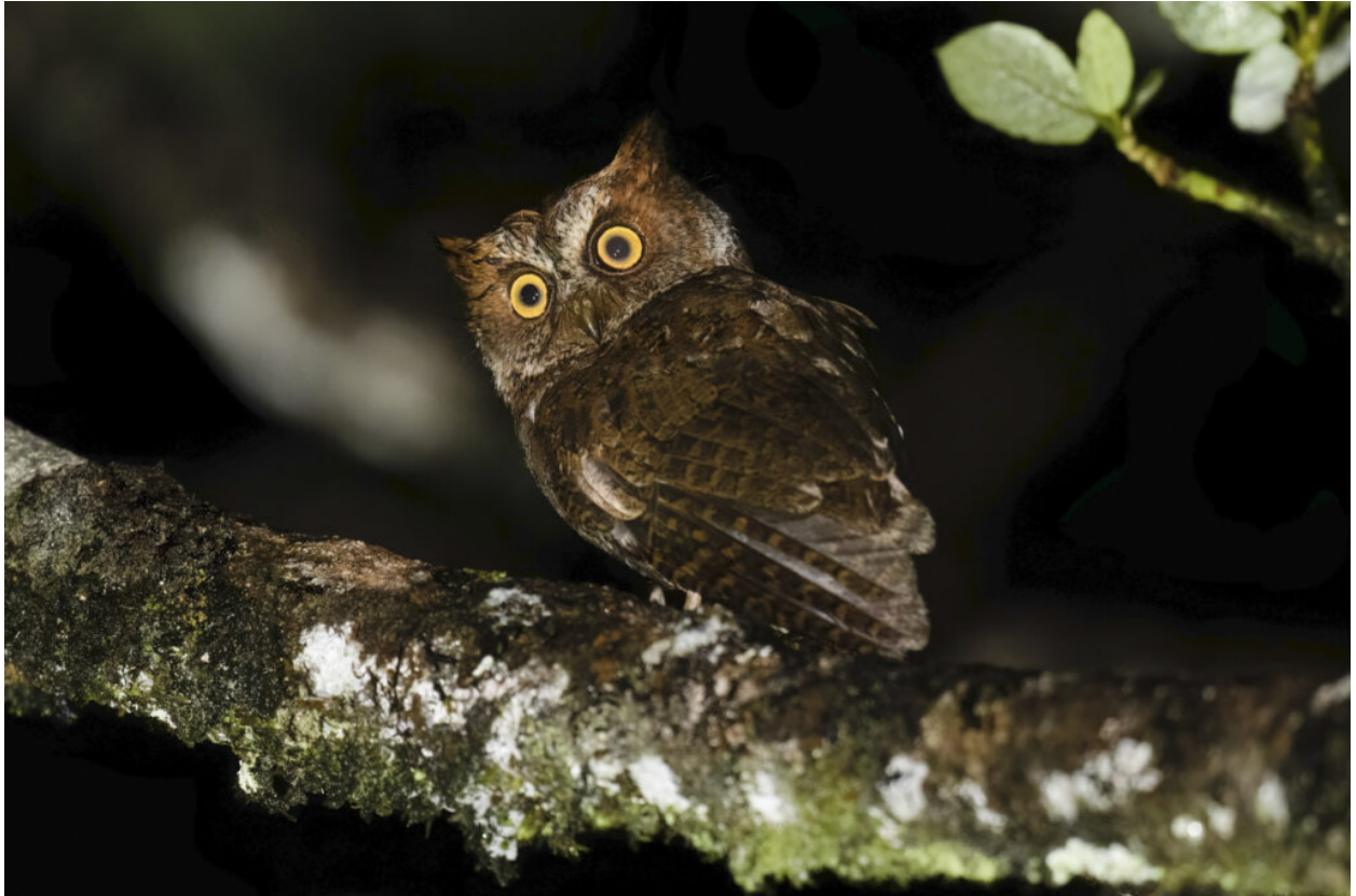
Luzon Scops Owl