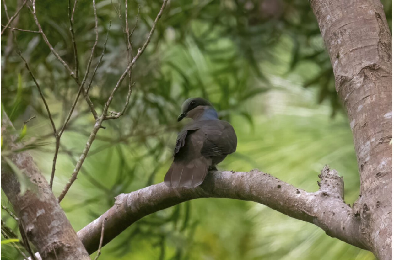
Buff-eared Brown Dove