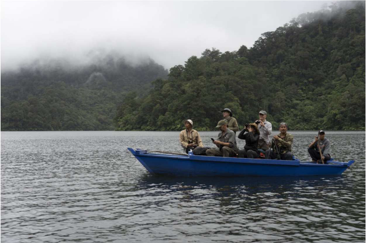
Boat birding at the Twin Lakes, Negros