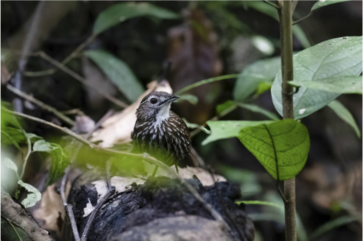
Striated Wren-Babbler