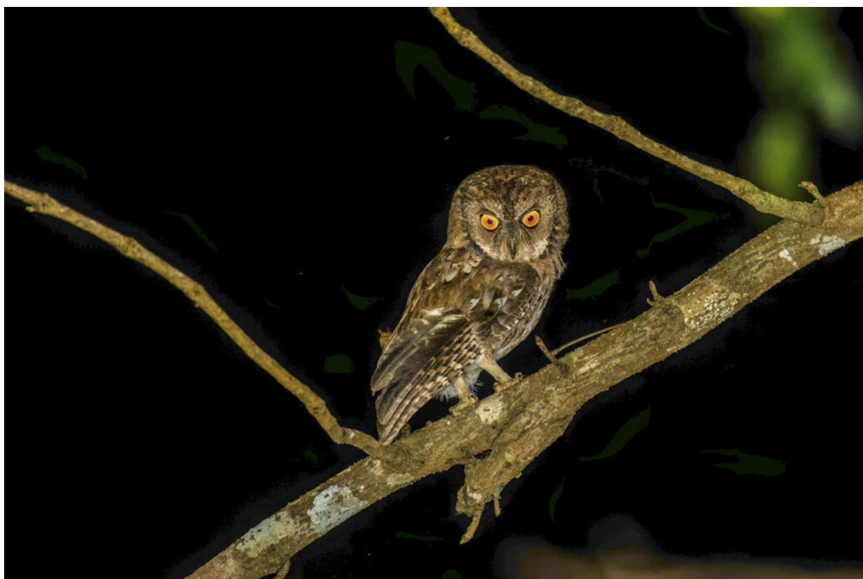
Mantanani Scops Owl