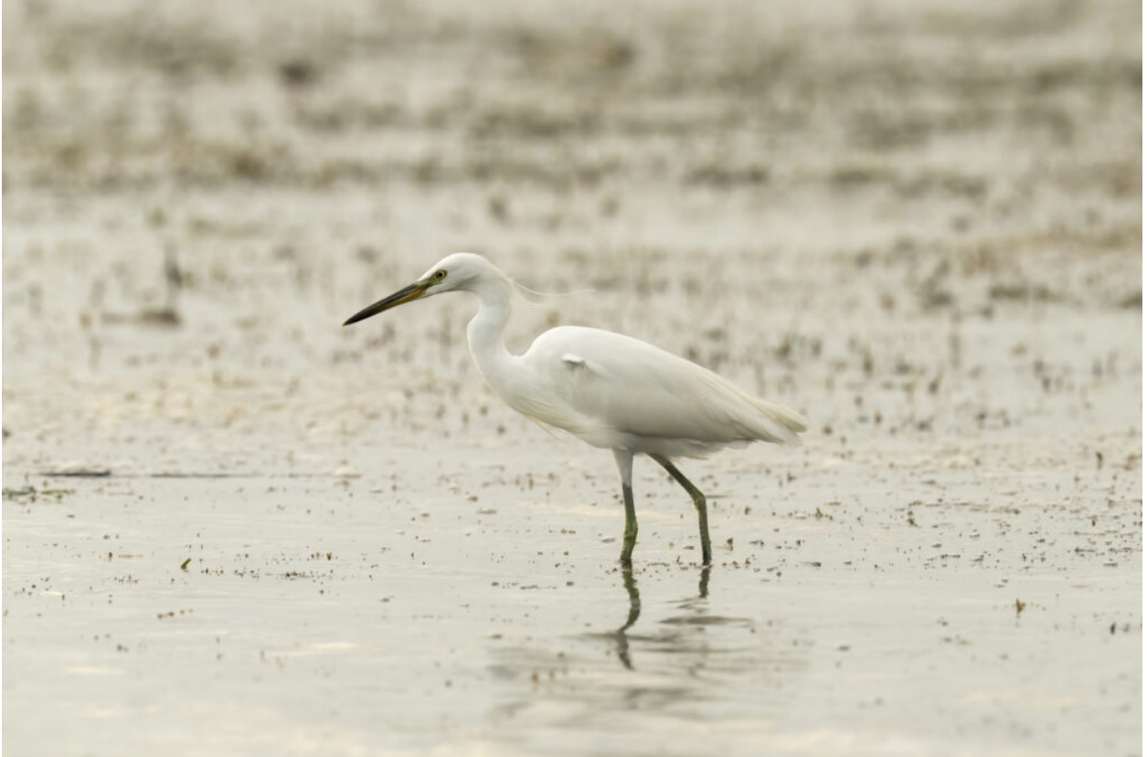
Chinese Egret