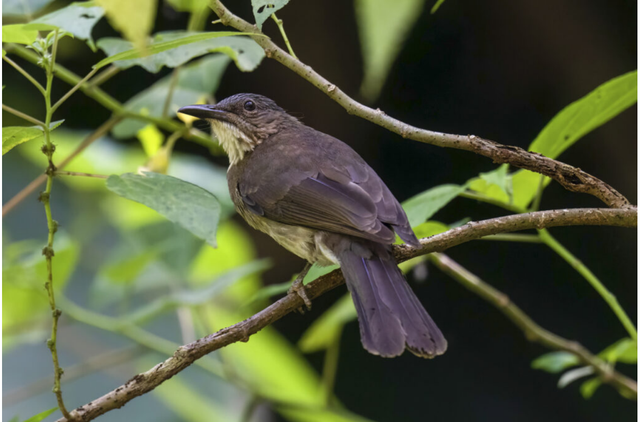
Streak-breasted Bulbul of the Tablas form