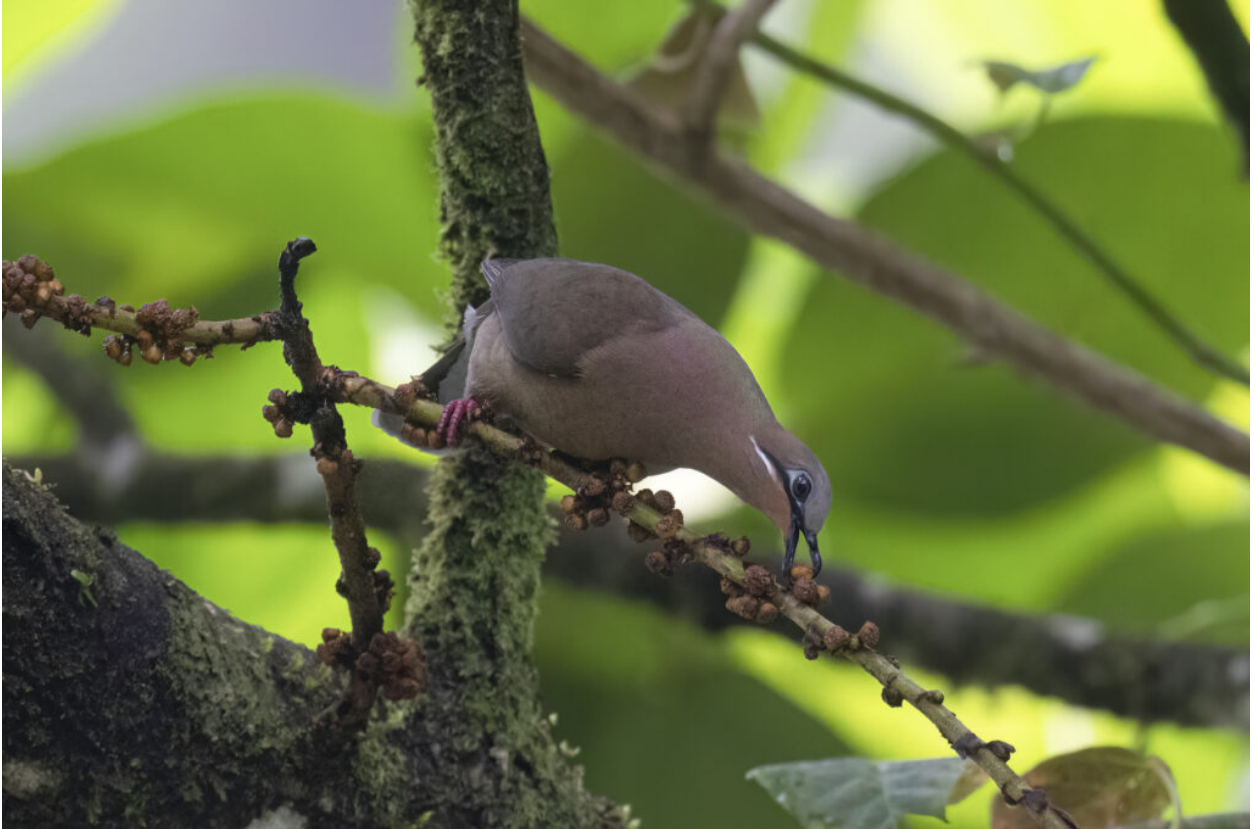
White-eared Brown Dove