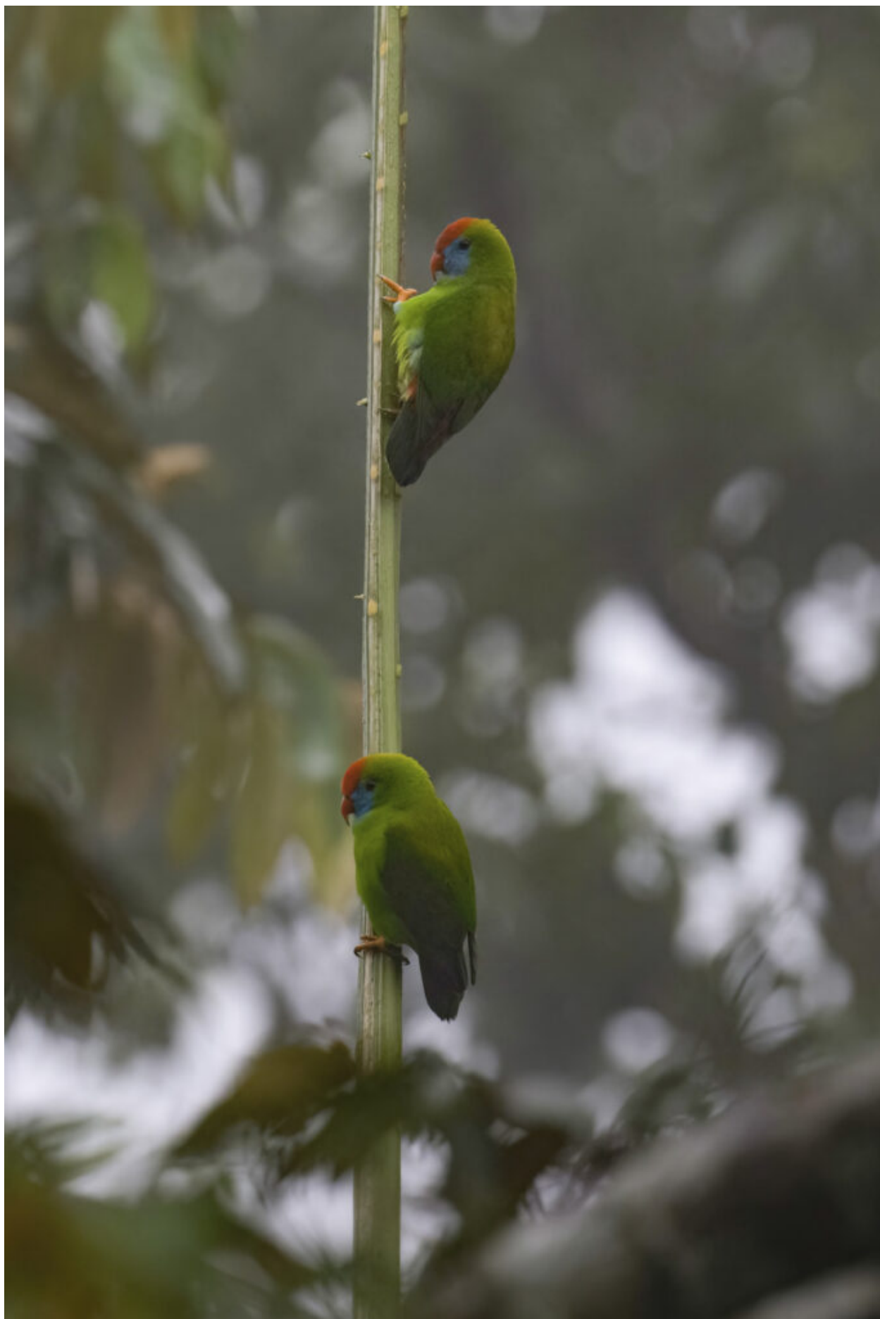
Camiguin Hanging Parrots