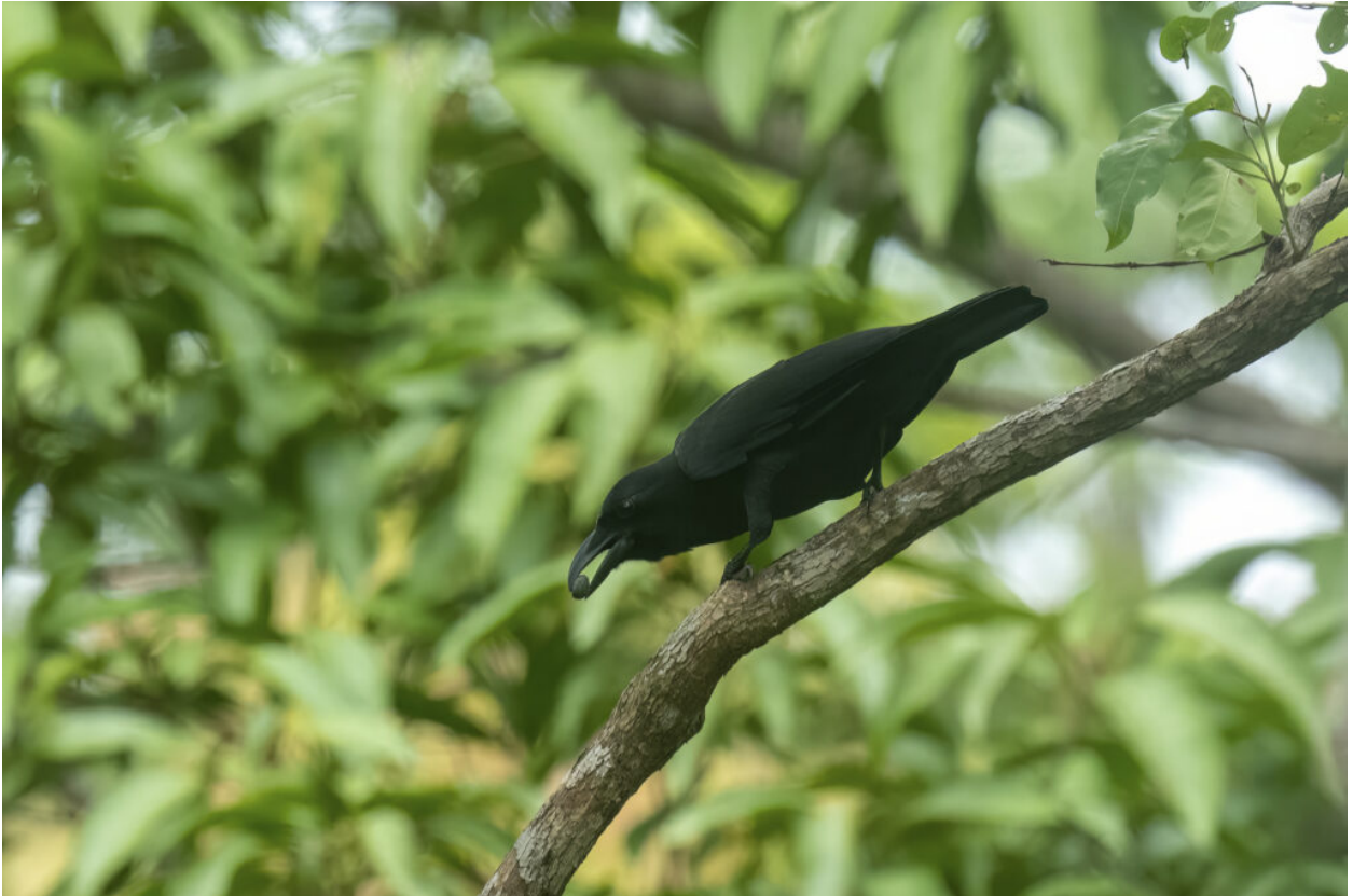
Palawan Crow