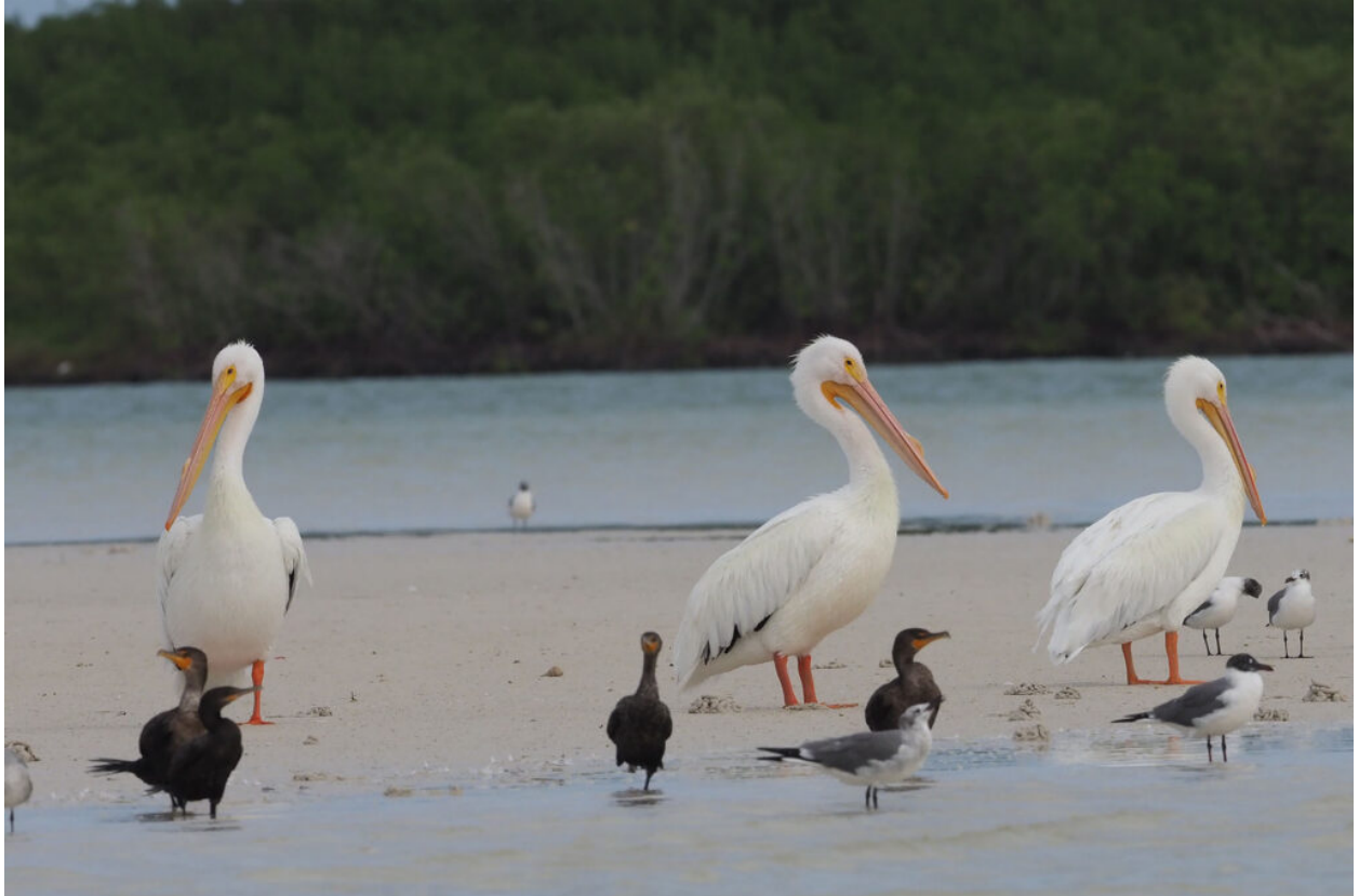
American White Pelicans