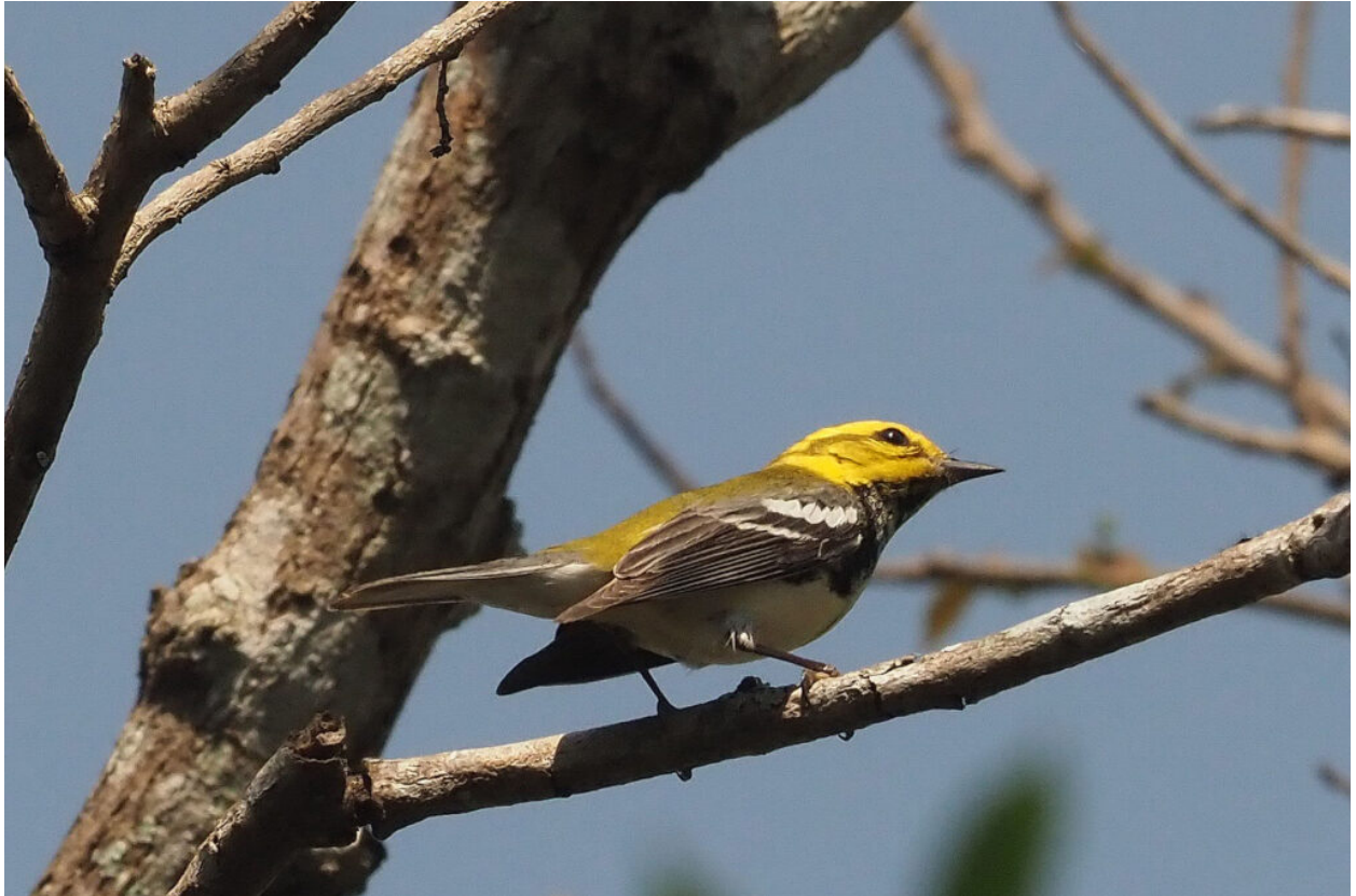
Black-throated Green Warbler