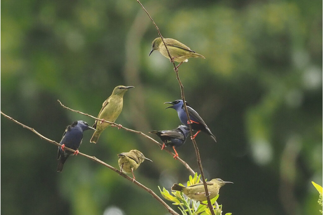
Red-legged Honeycreepers