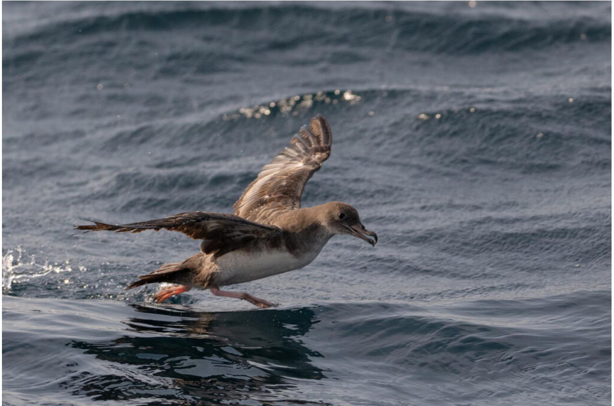
Pink-footed Shearwater