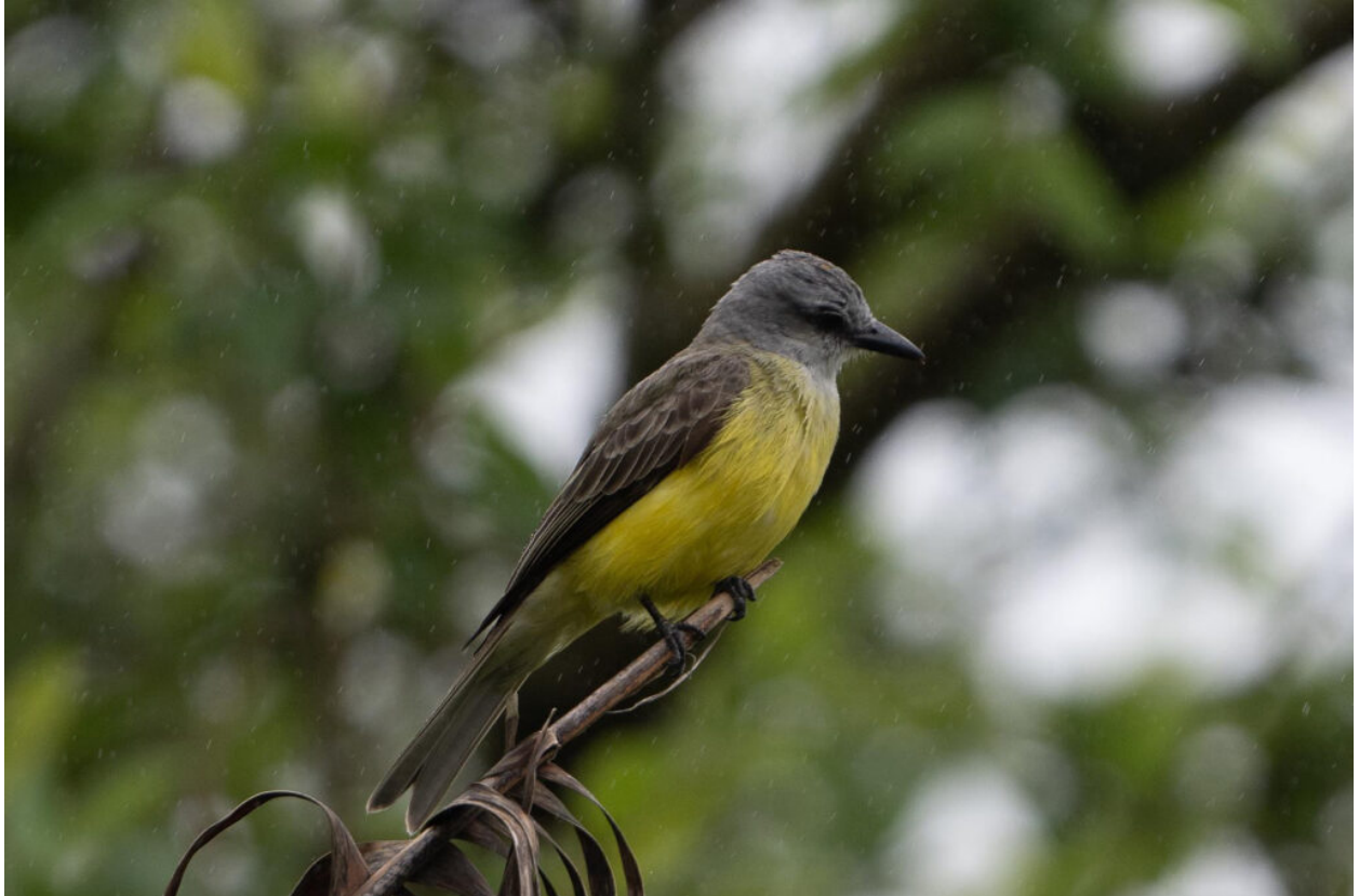
Couch's Kingbird