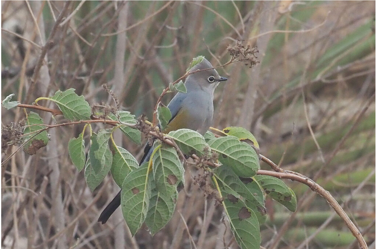
Grey Silky-flycatcher