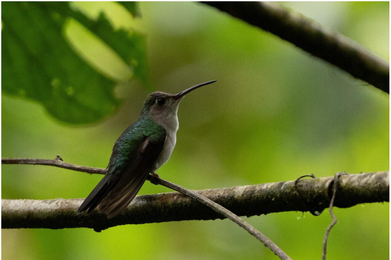
Wedge-tailed Sabrewing