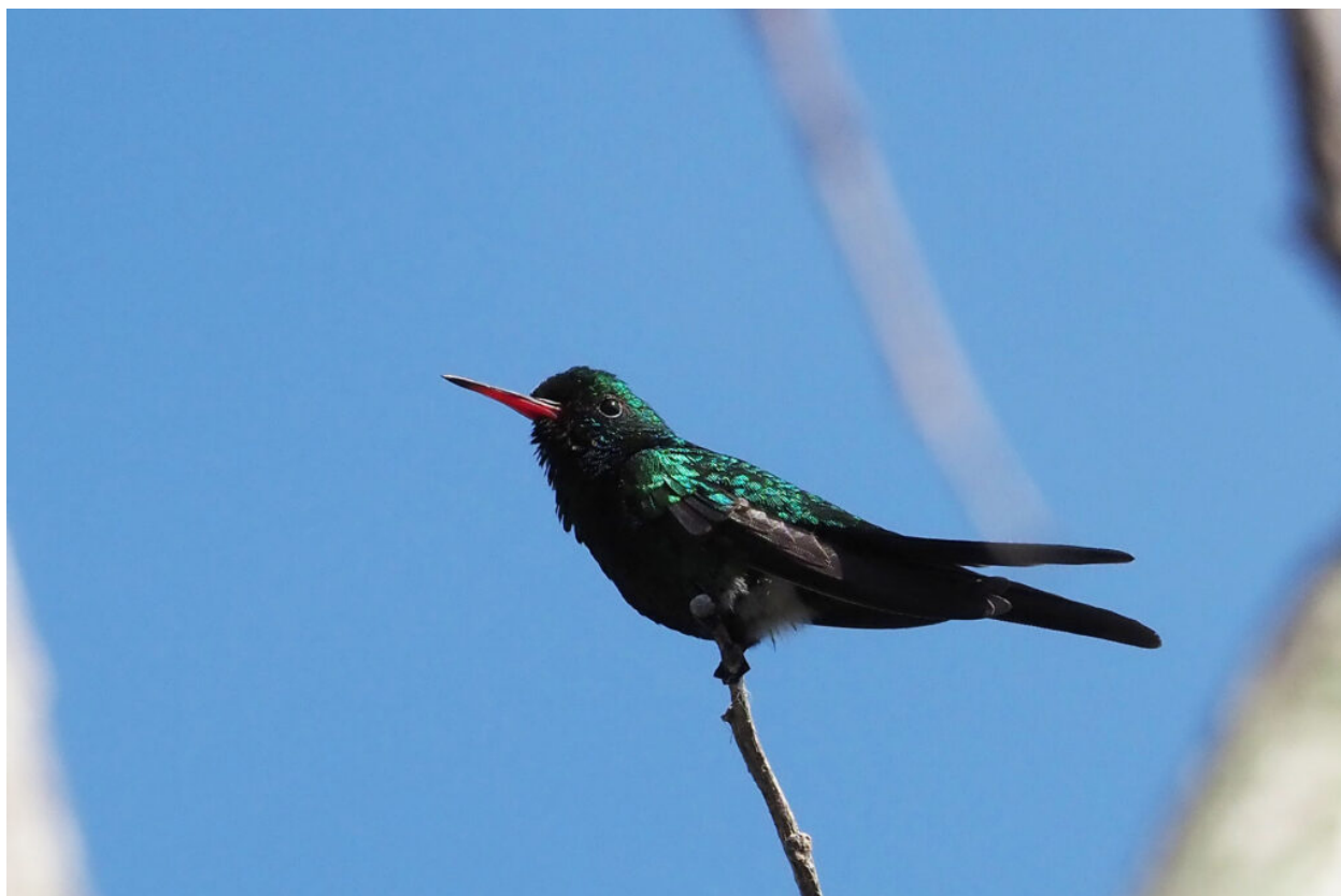
Cozumel Emerald