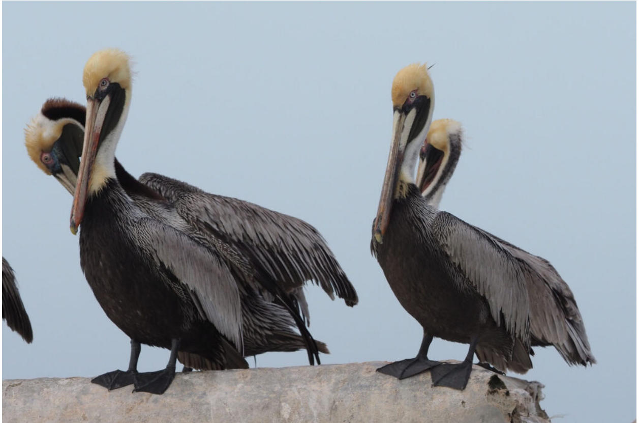
Brown Pelicans