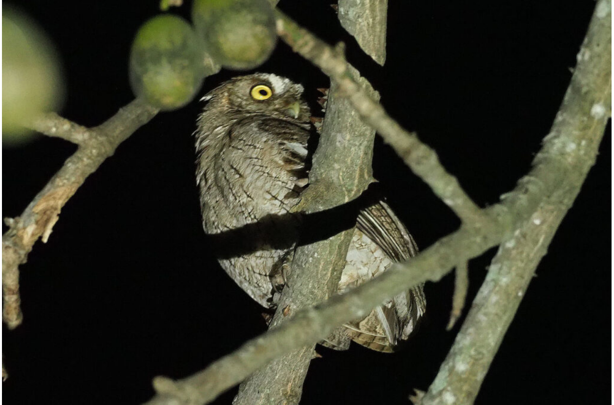
Pacific Screech Owl