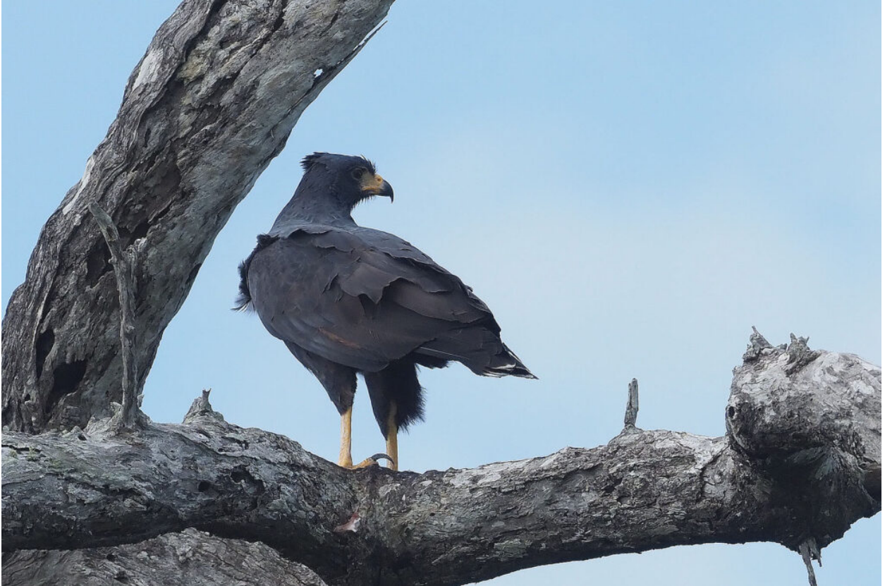
Common Black Hawk