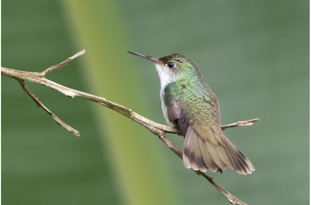
White-bellied Emerald