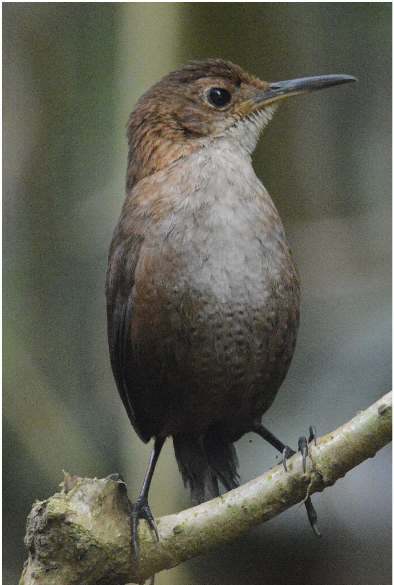
Nava's Wren