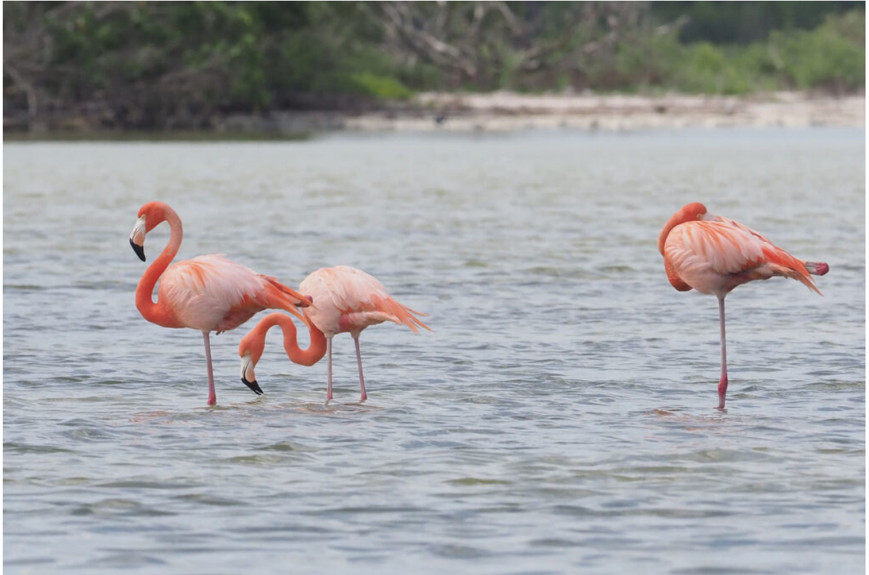
American Flamingos