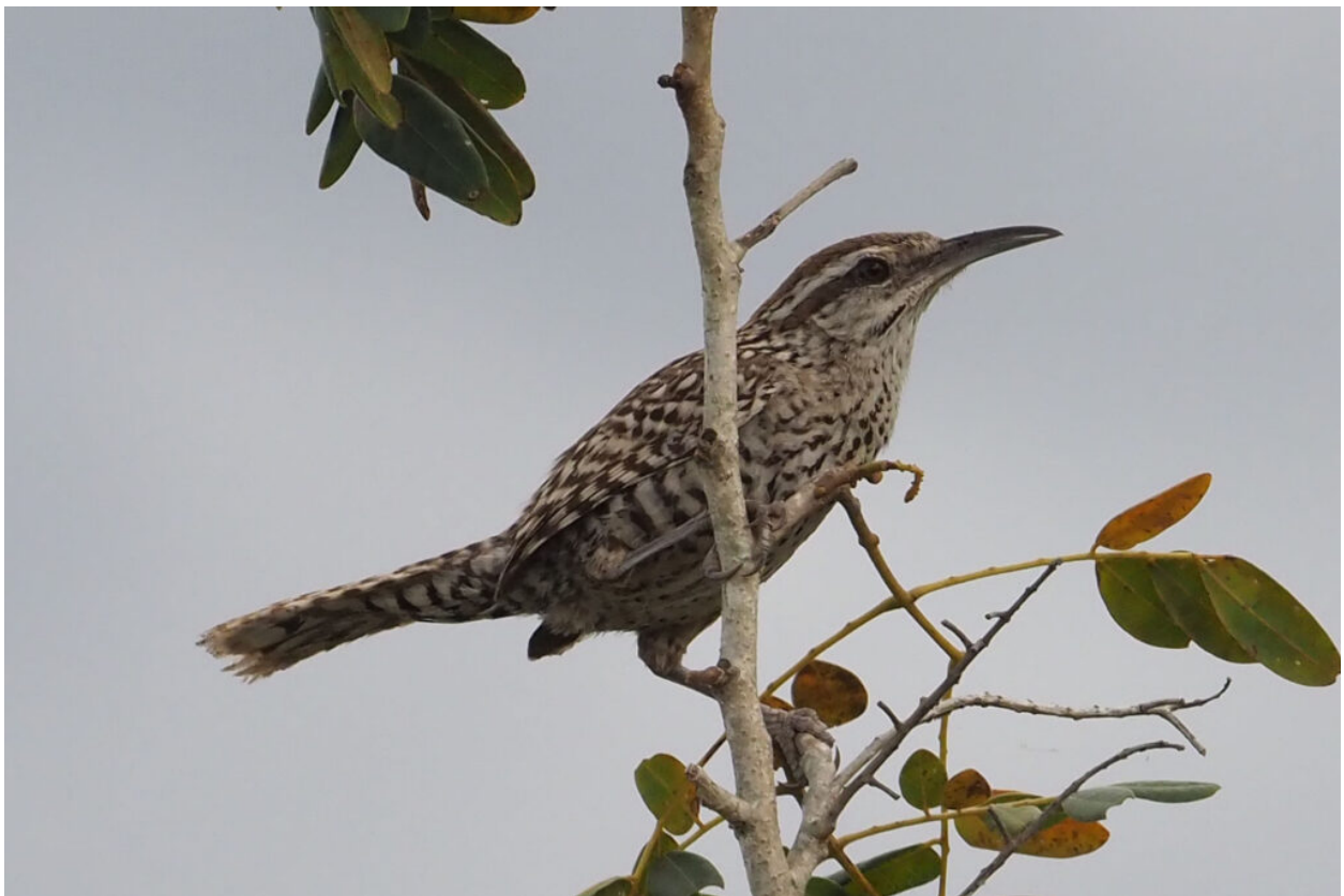
Yucatan Wren

Common Basilisk Basiliscus basiliscus A nice sighting in the Sierra de los Tuxtlas.