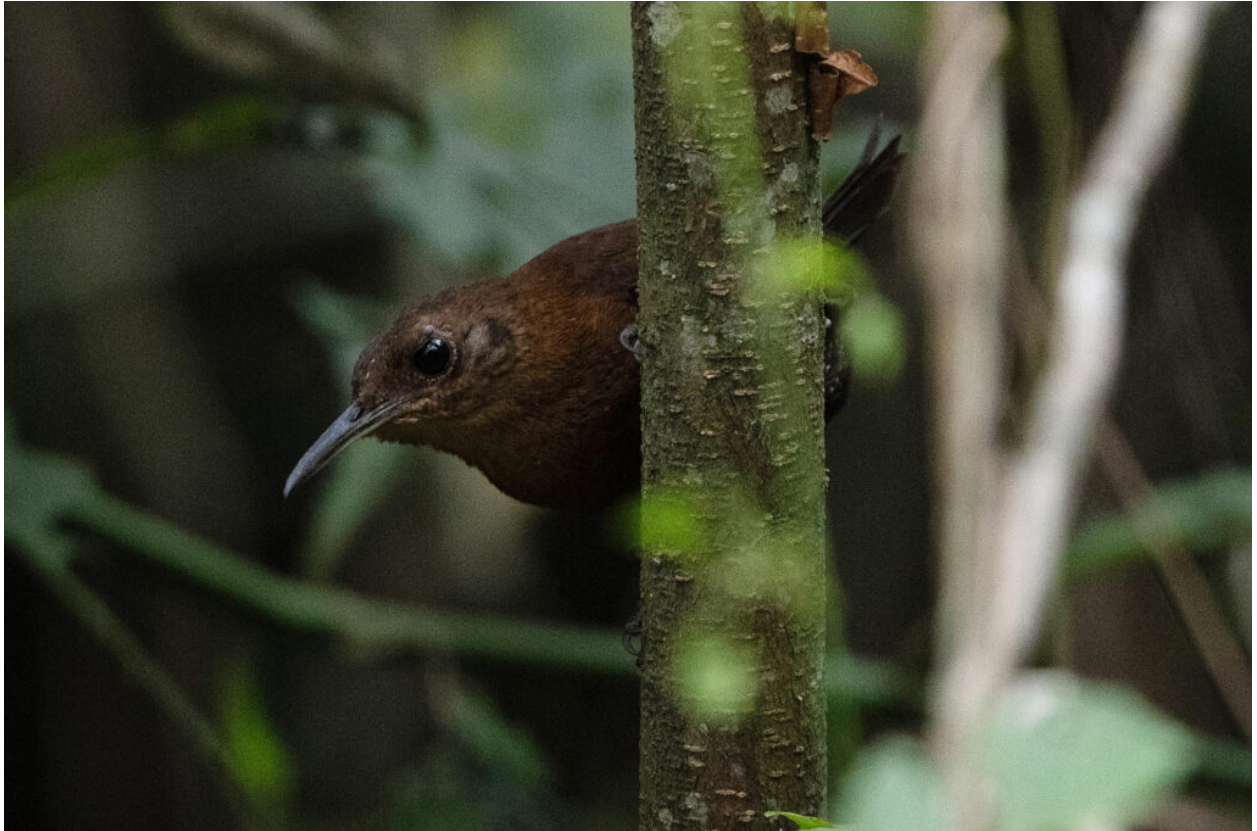
Sumichrast's Wren