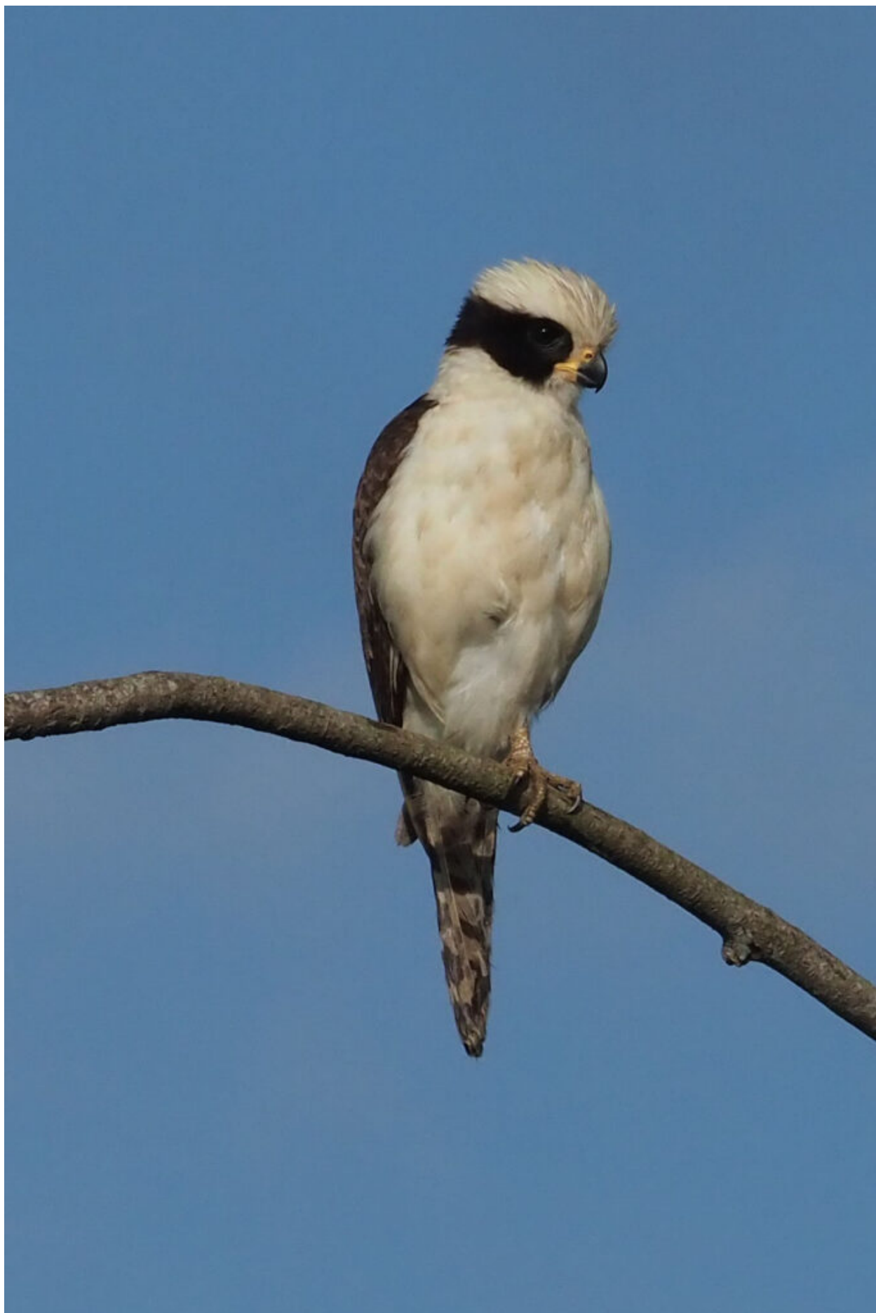
Laughing Falcon