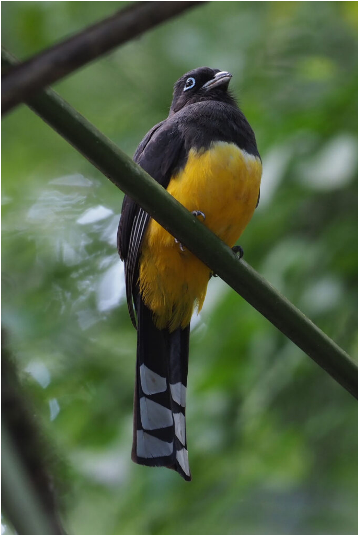
Black-headed Trogon