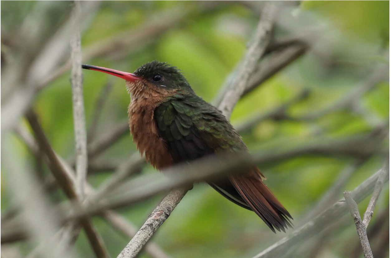
Cinnamon Hummingbird