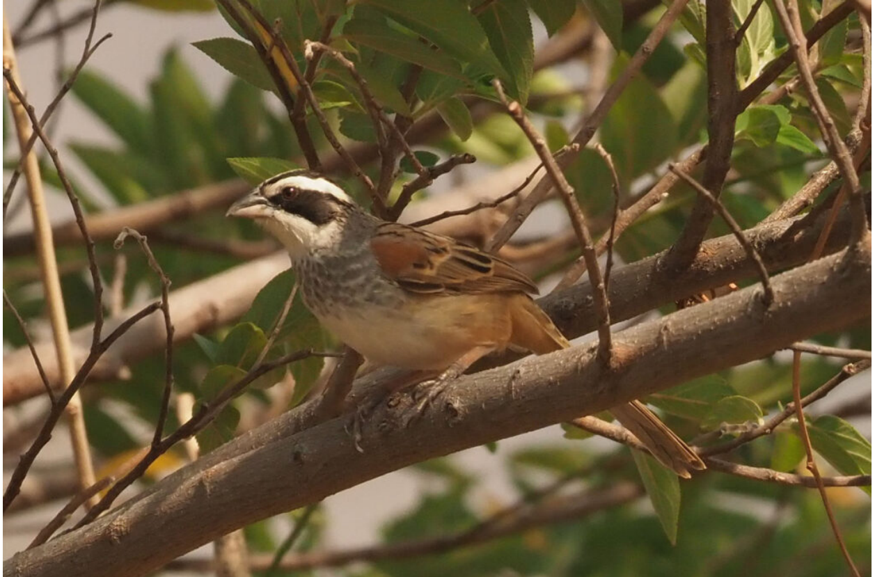
Stripe-headed Sparrow