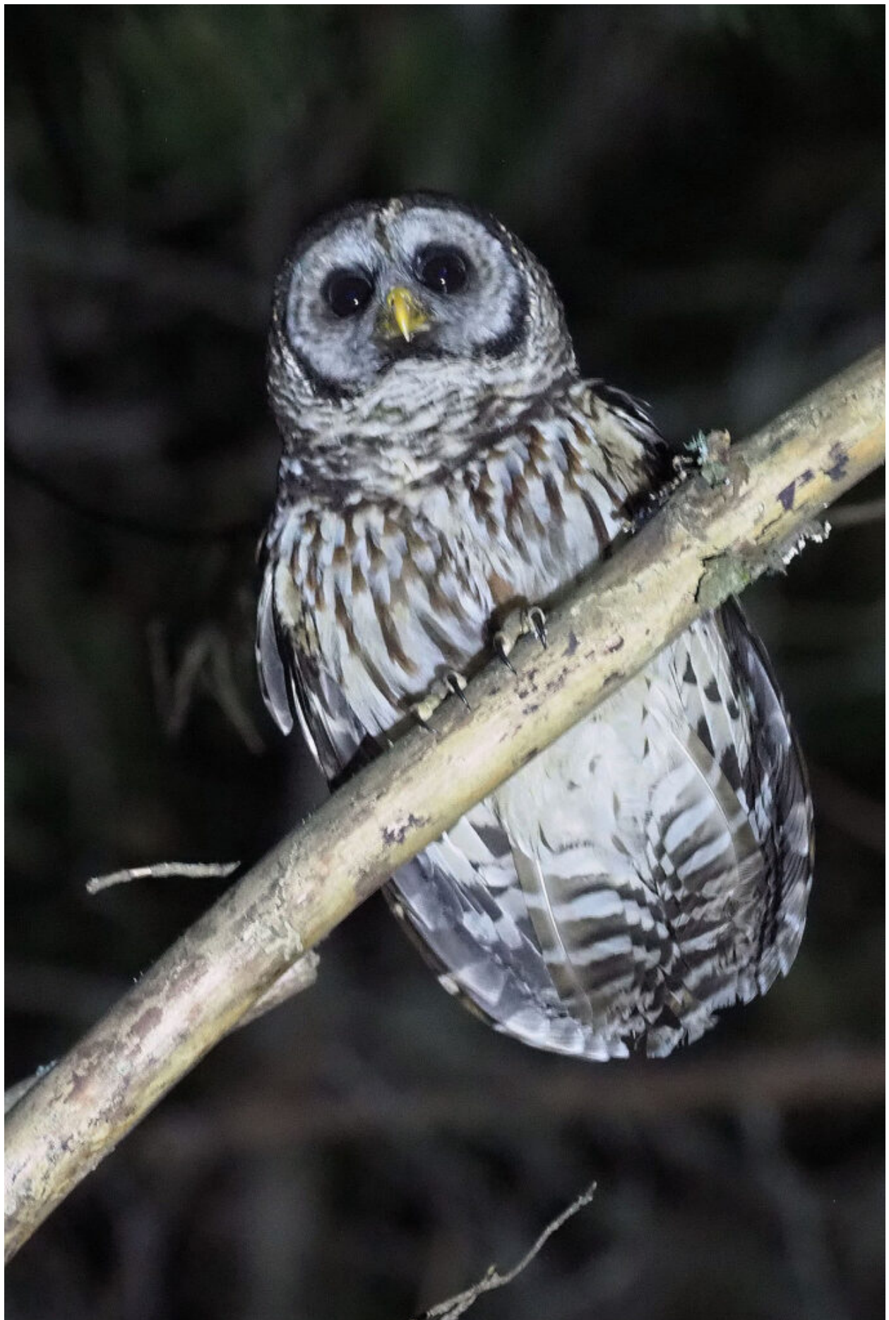
Fulvous Owl