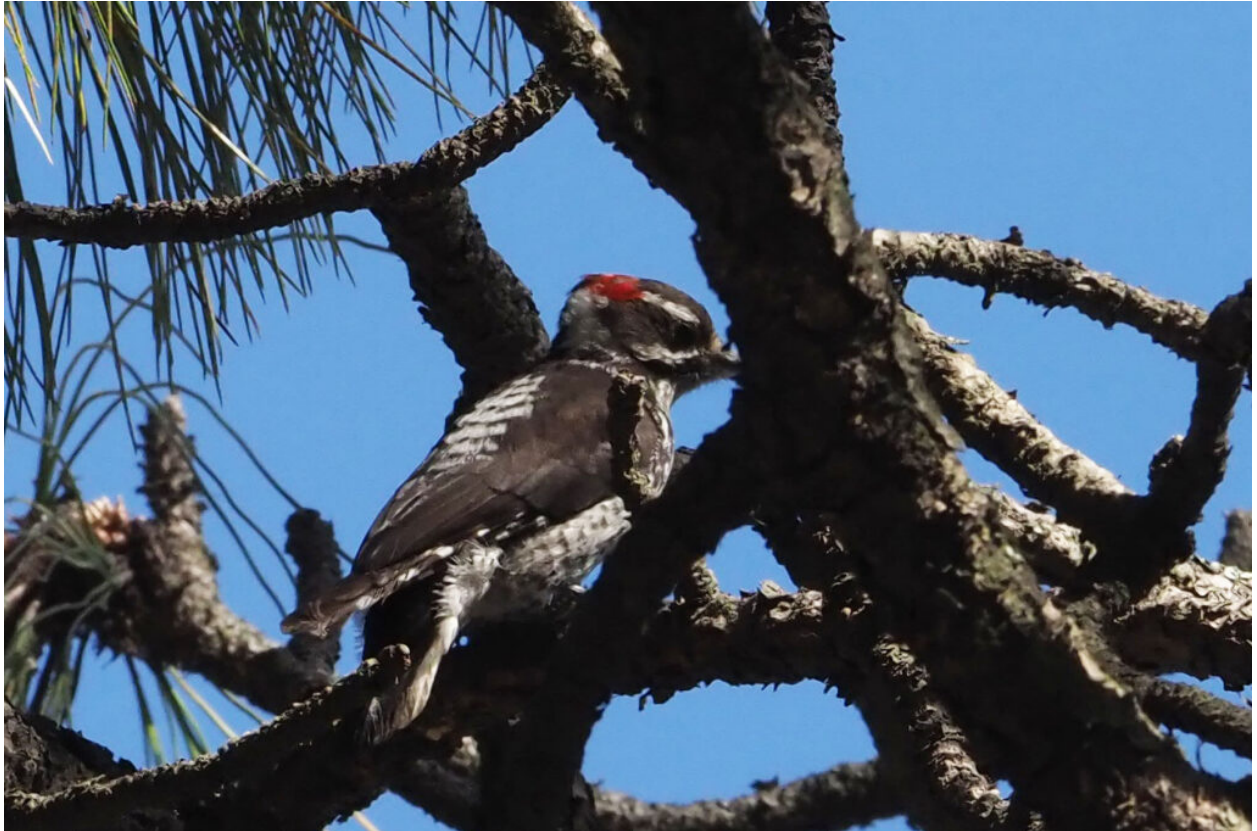
Strickland's Woodpecker