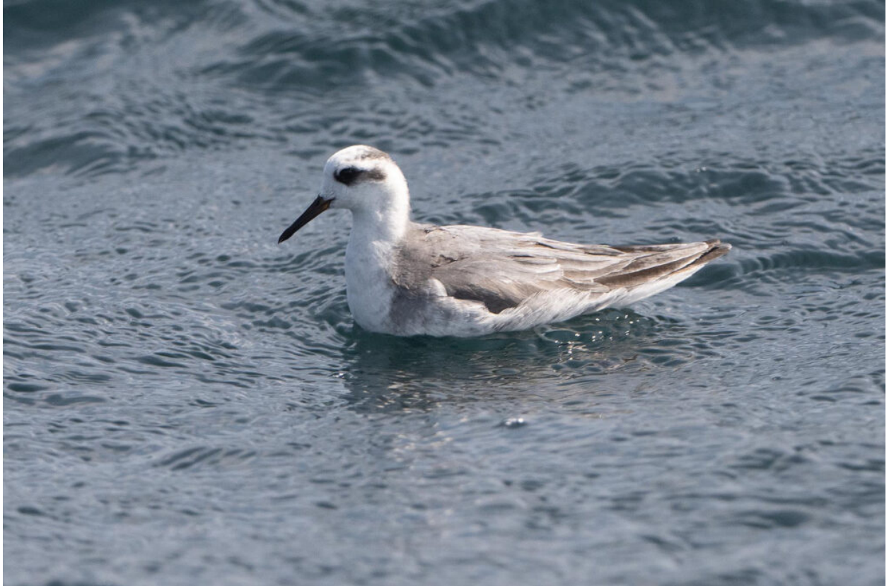
Red Phalarope