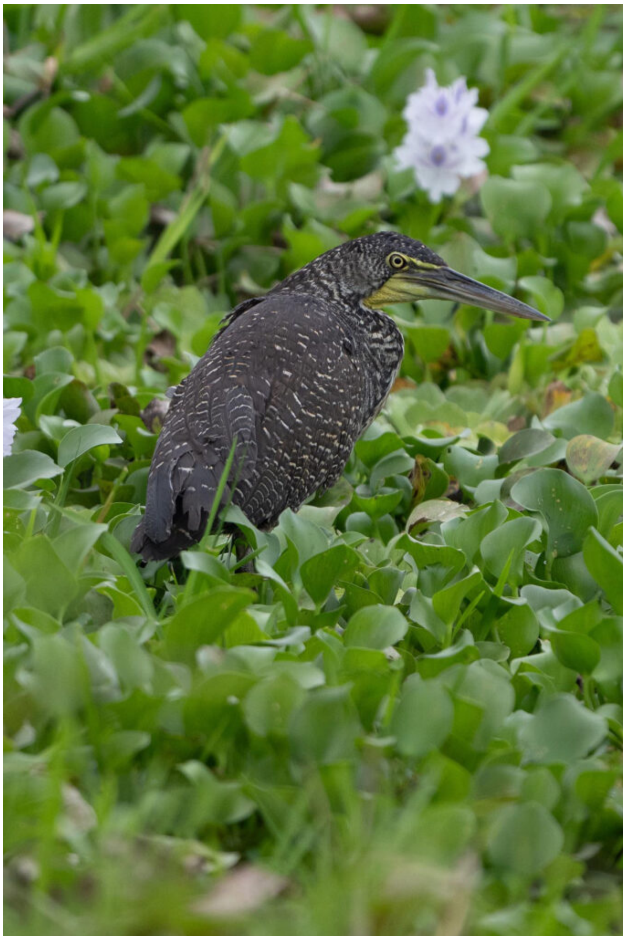
Bare-throated Tiger Heron