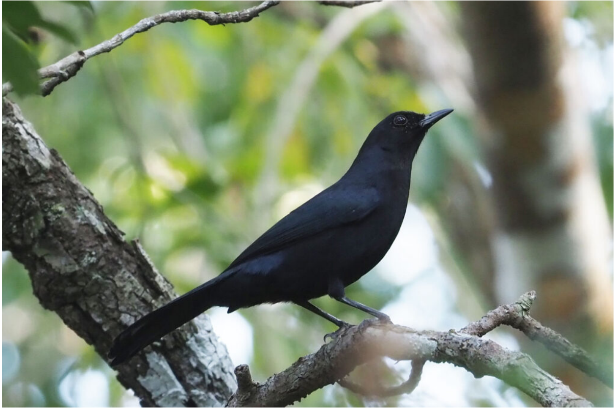
Black Catbird