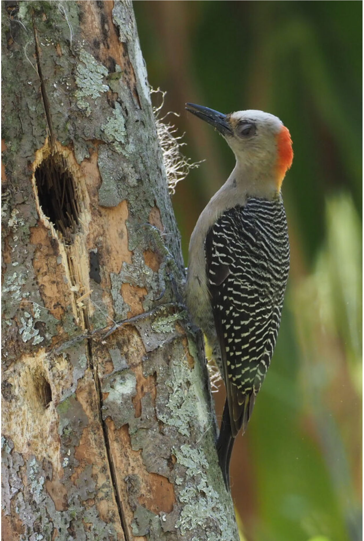
Velasquez's Woodpecker