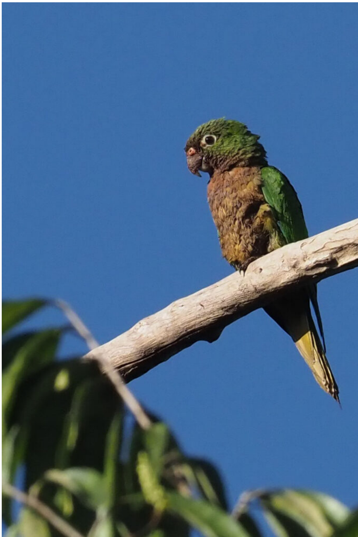
Olive-throated Parakeet