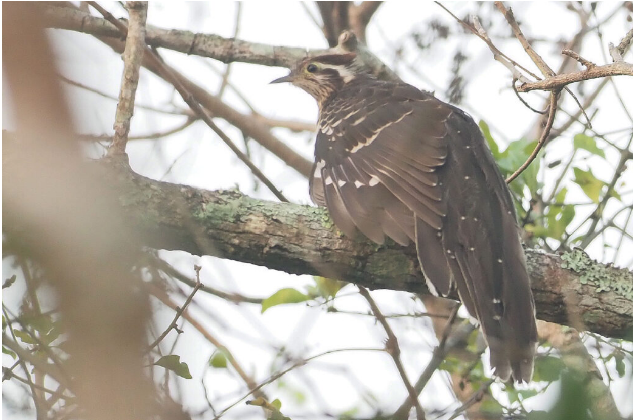
Pheasant Cuckoo