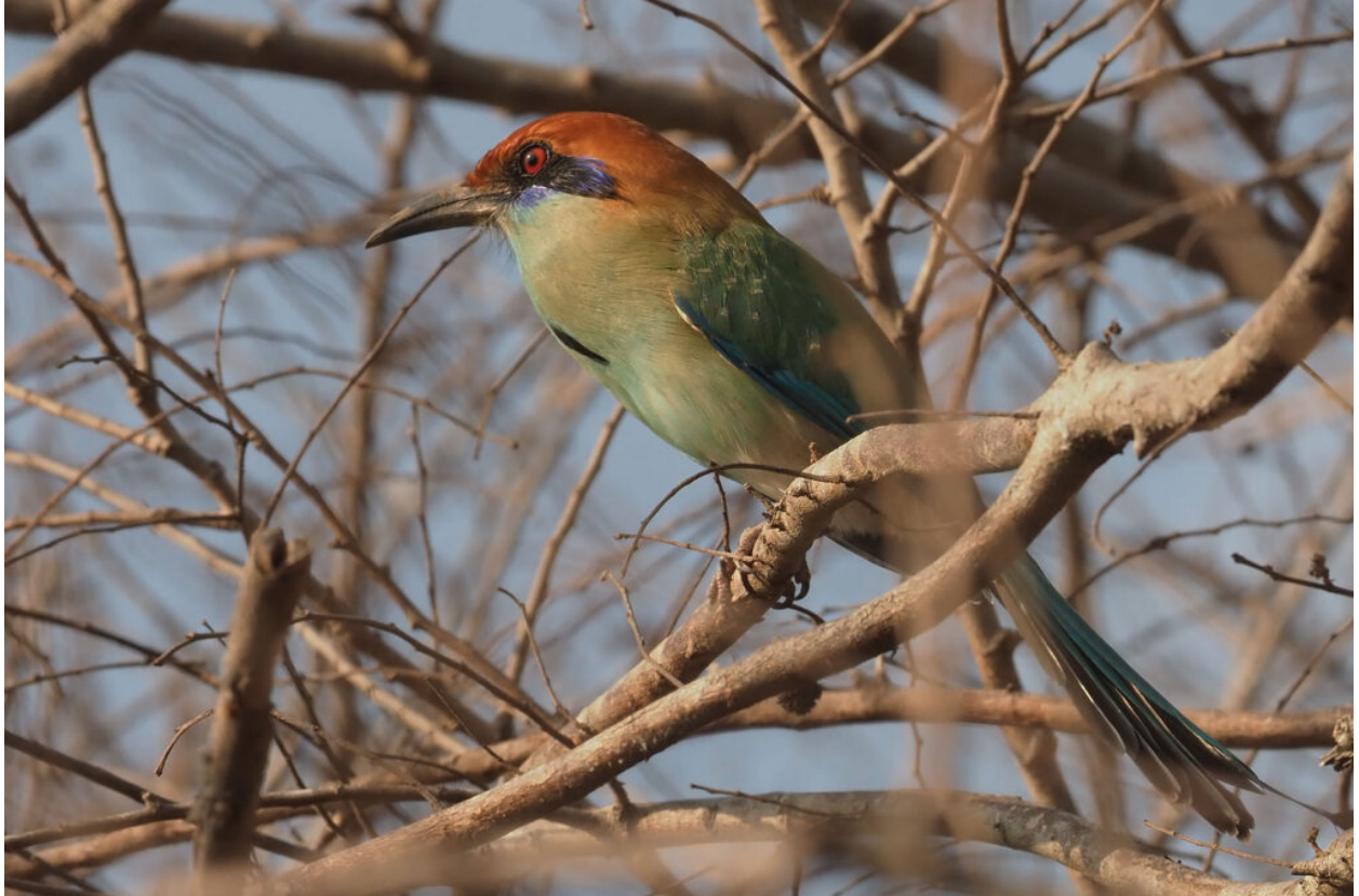
Russet-crowned Motmot