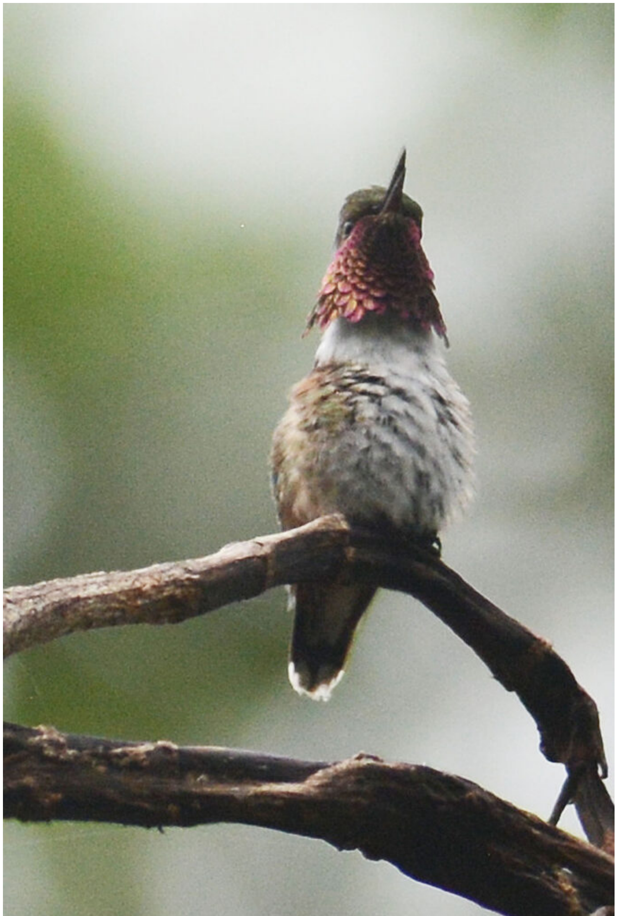
Bumblebee Hummingbird