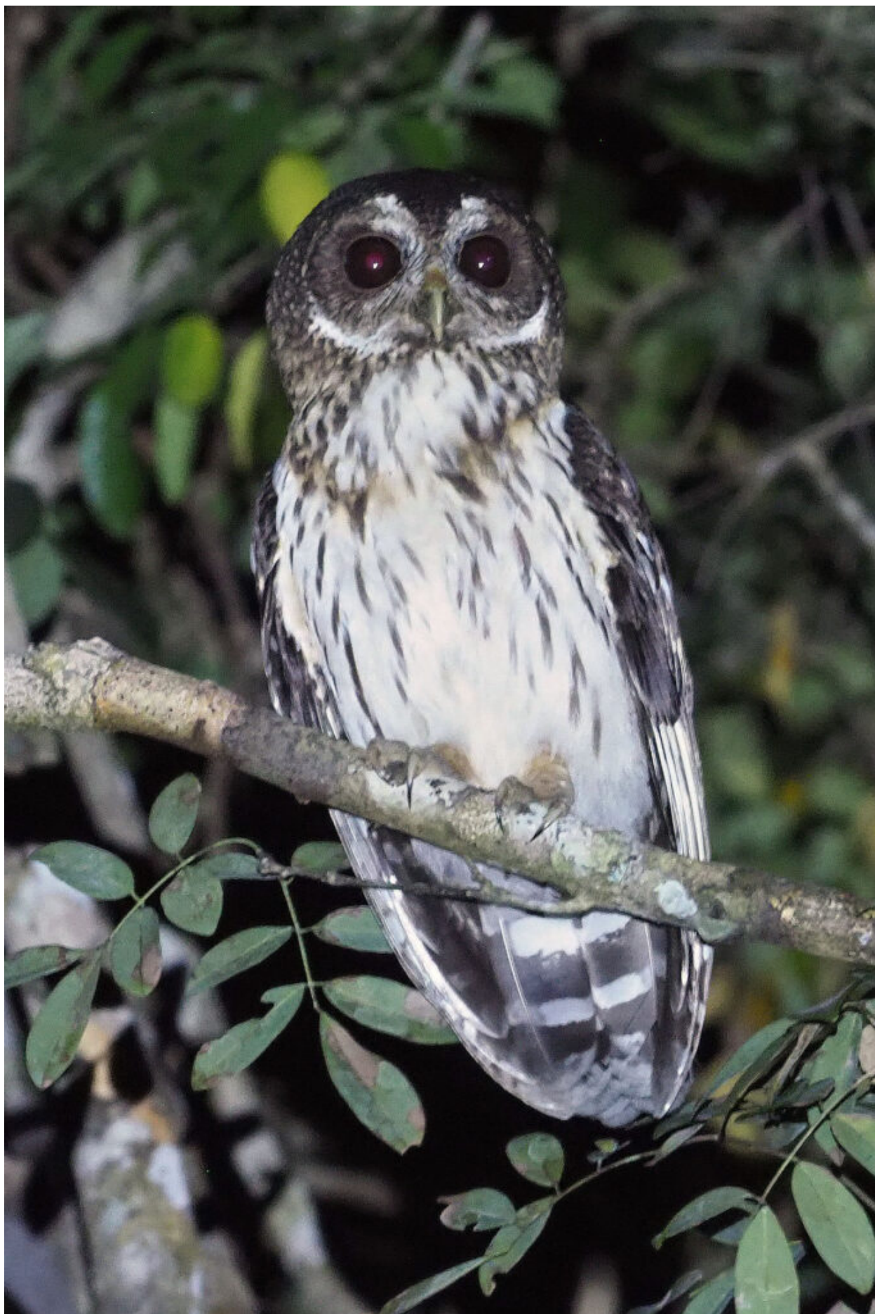
Mottled Owl