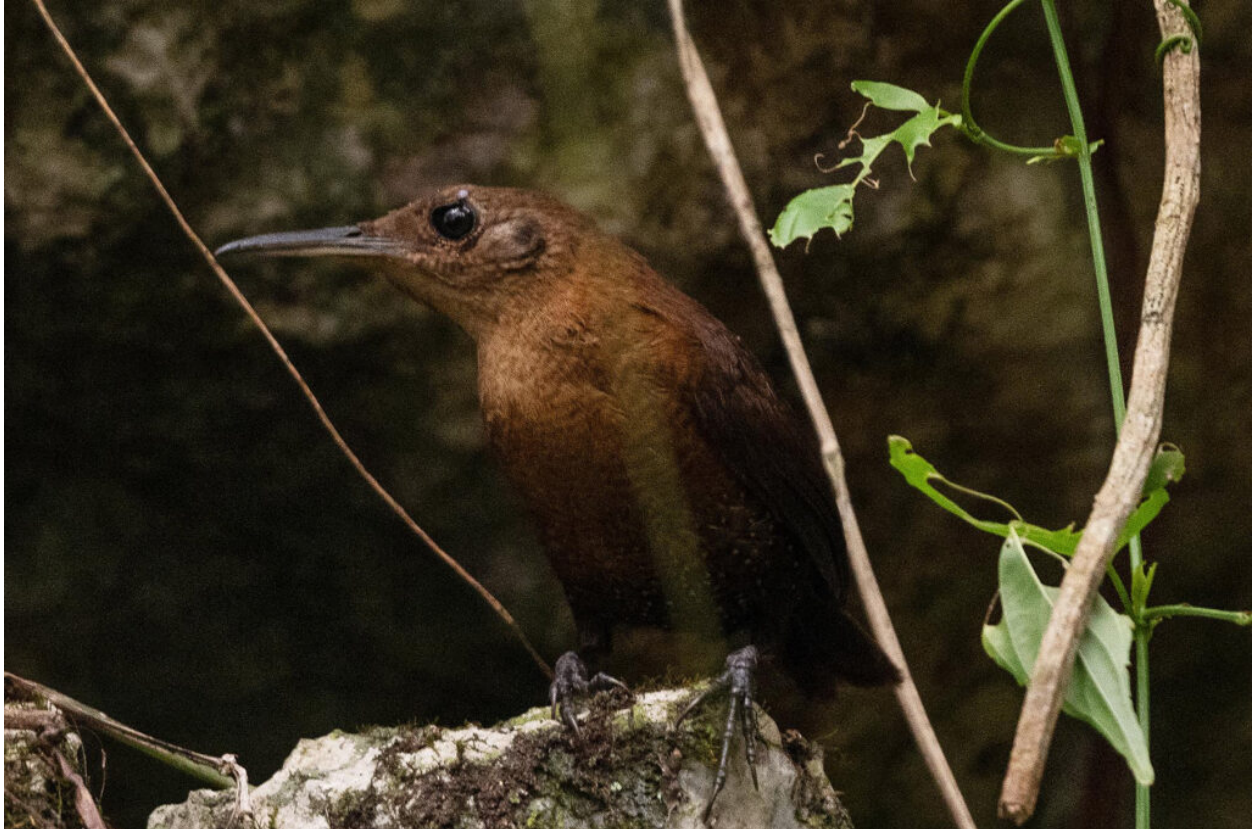
Sumichrast's Wren