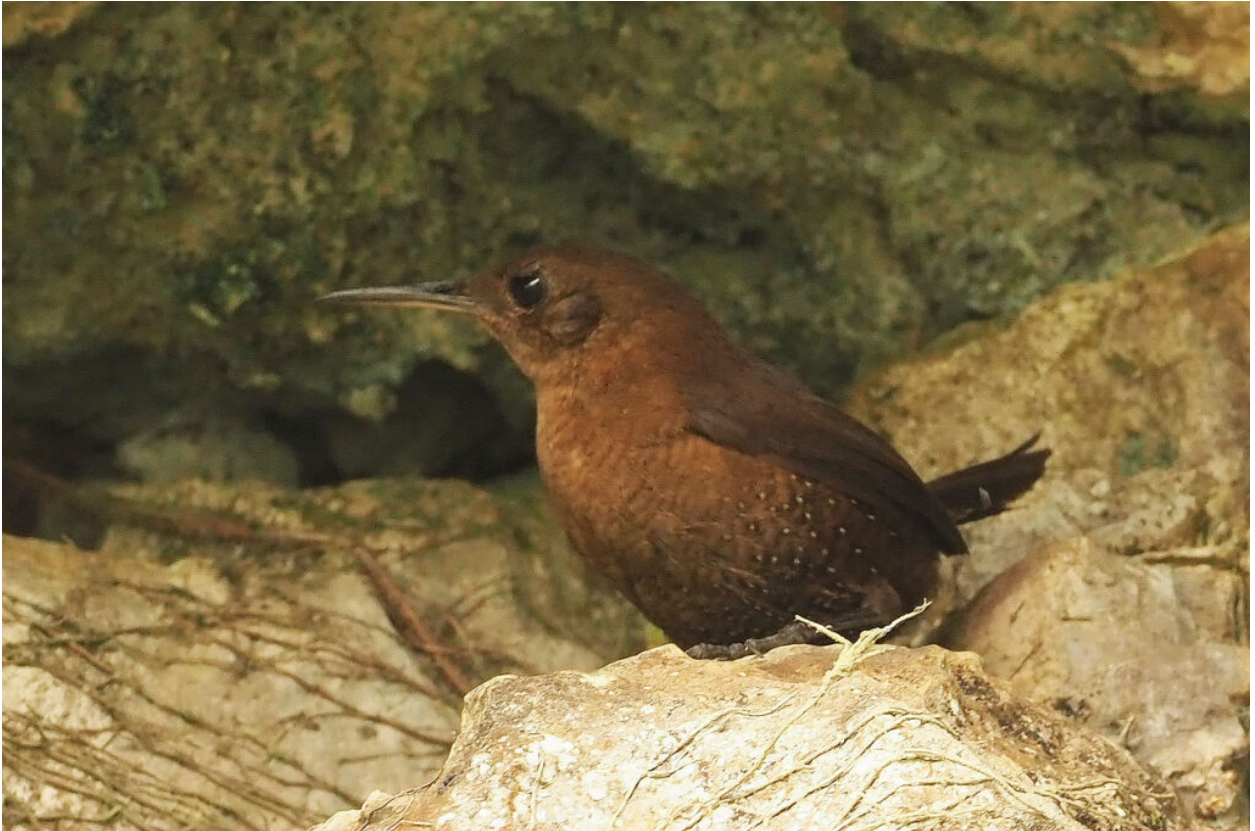
Sumichrast's Wren