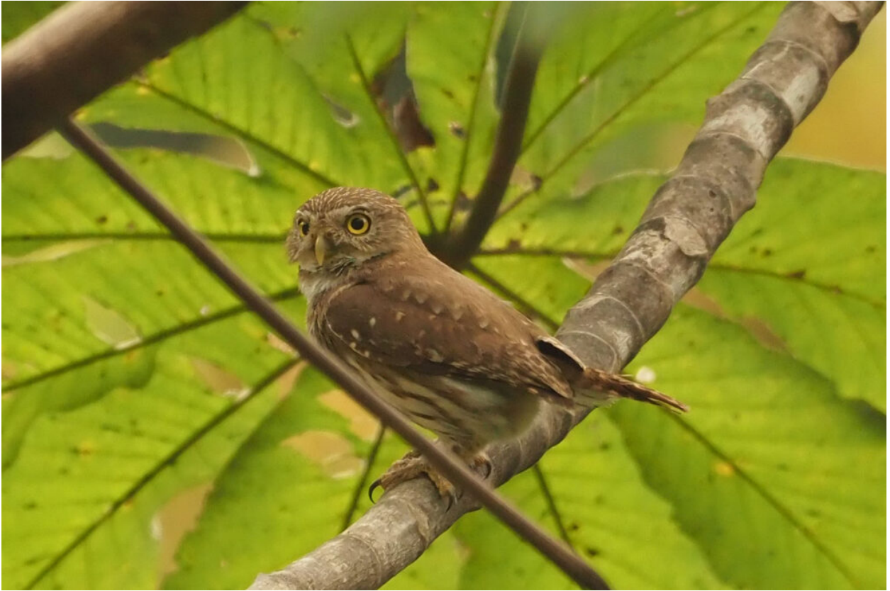
Colima Pygmy Owl