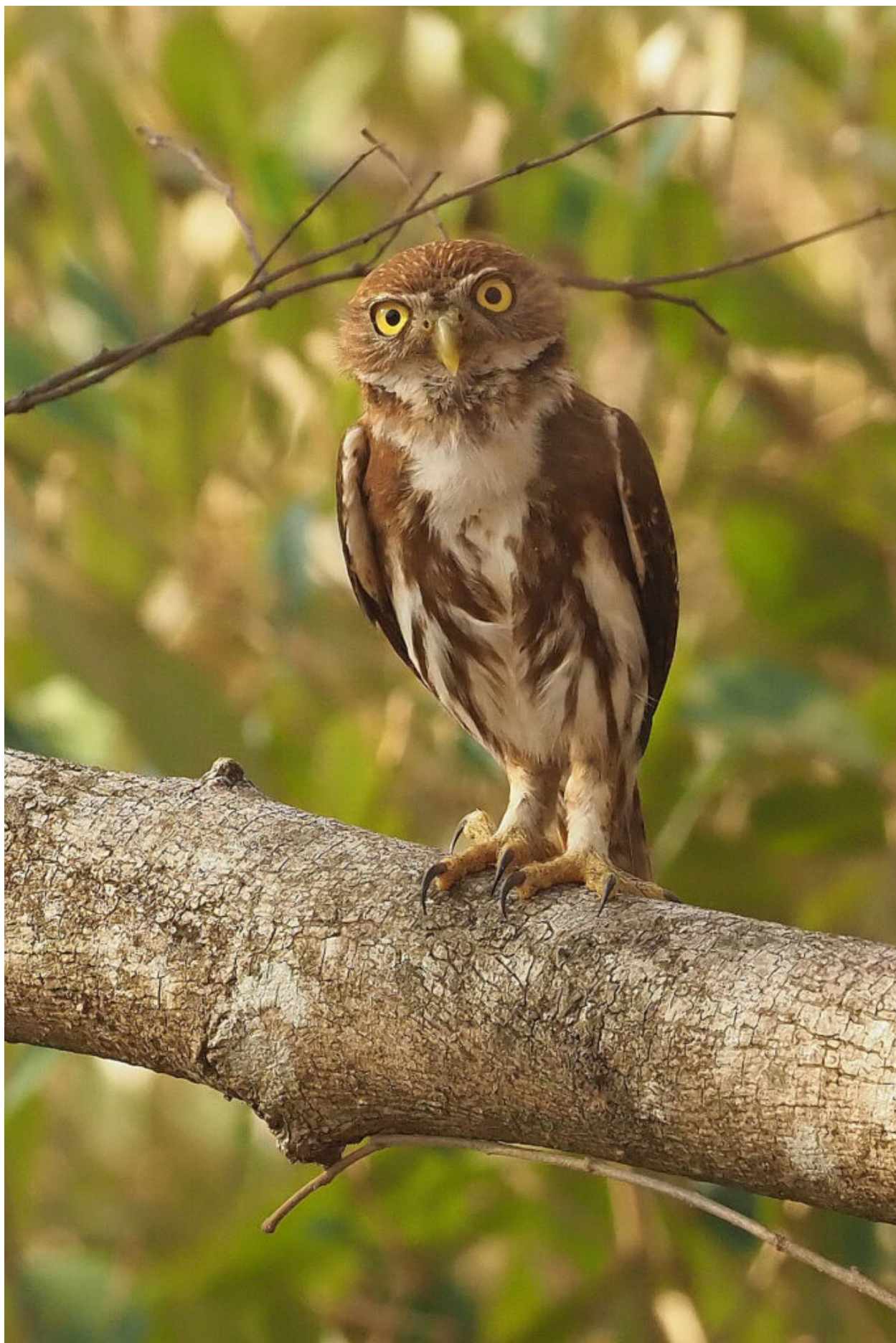
Ferruginous Pygmy Owl