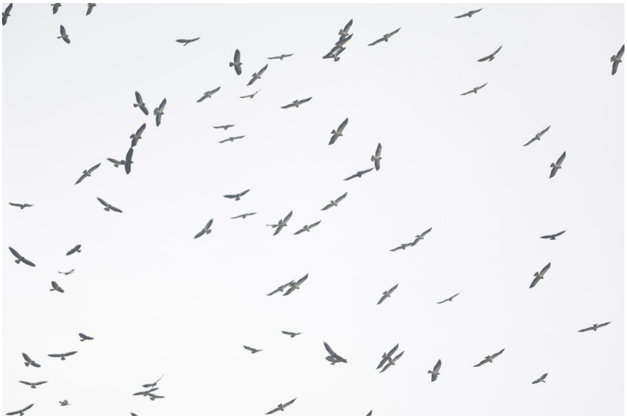
Swainson's Hawks