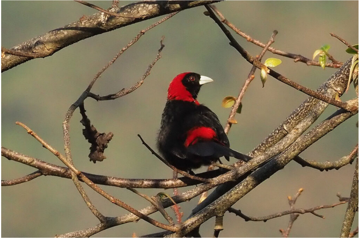
Crimson-collared Tanager