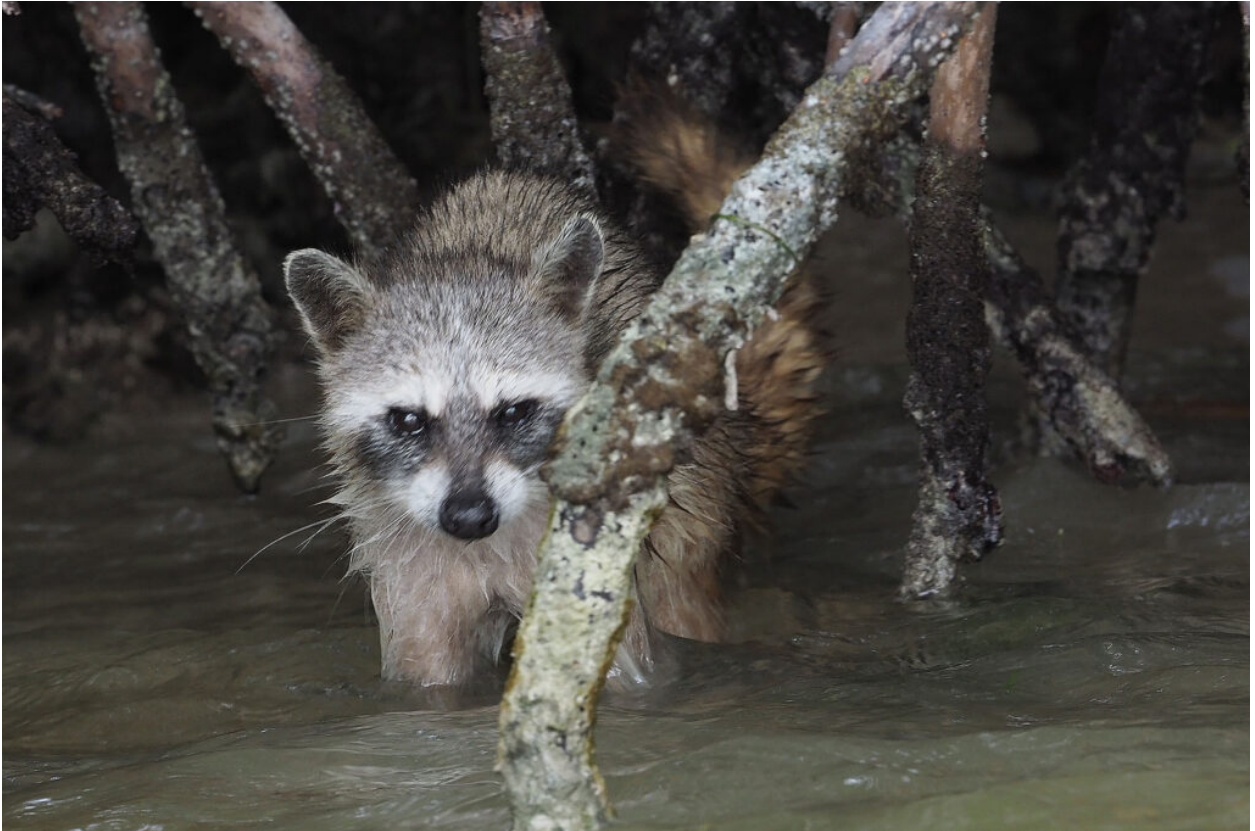
Northern Raccoon