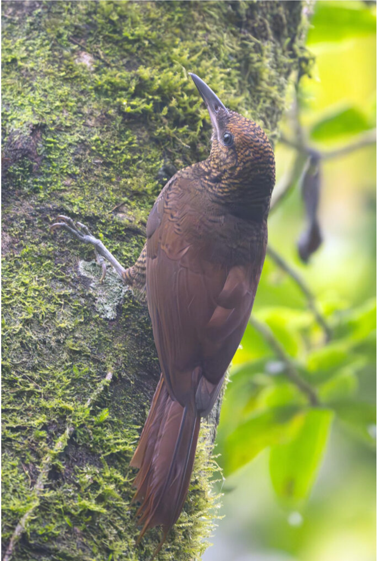
Northern Barred Woodcreeper