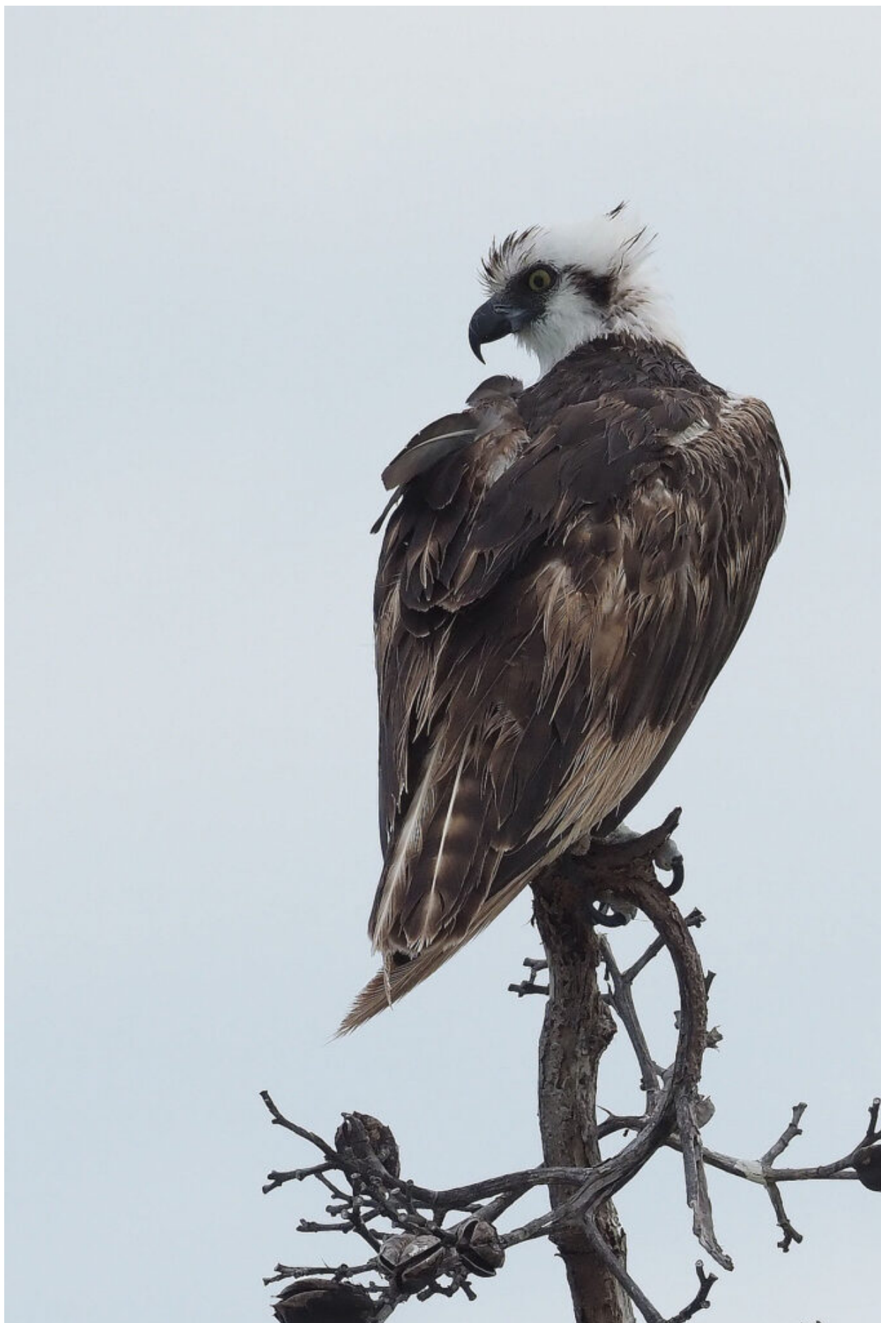
Osprey