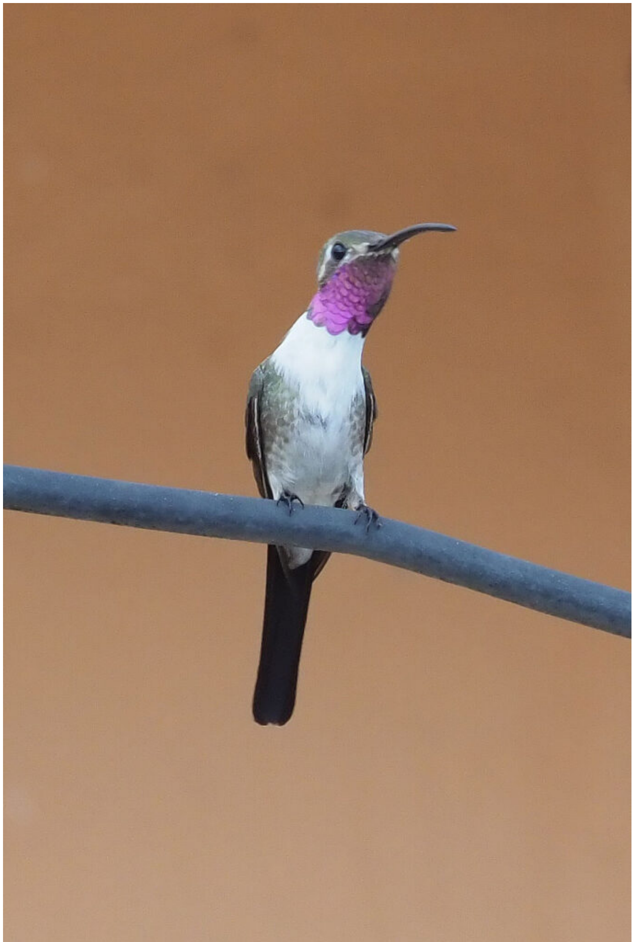
Mexican Sheartail