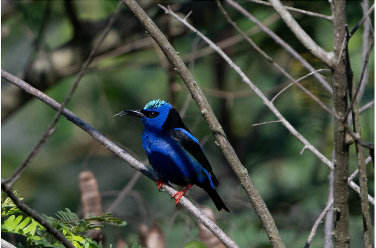
Red-legged Honeycreeper