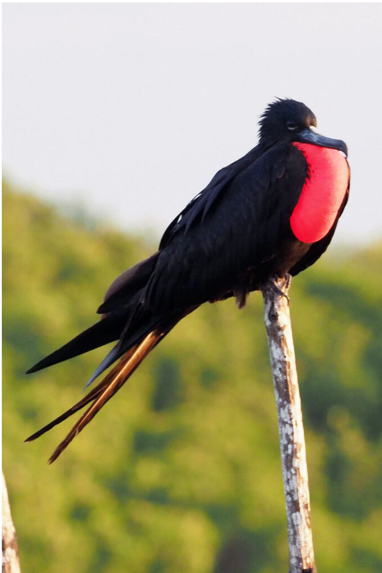
Magnificent Frigatebird