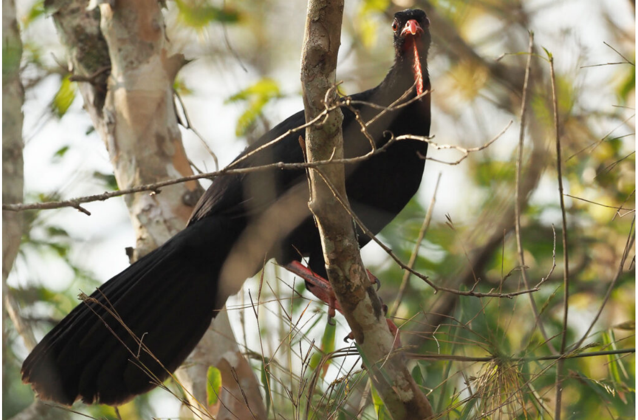
Highland Guan