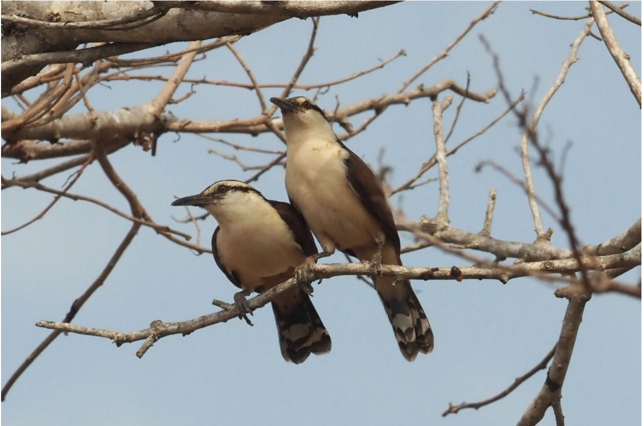
Giant Wren