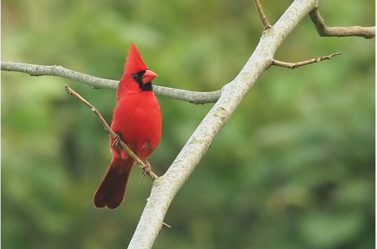
Northern Cardinal