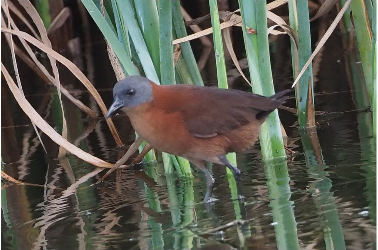
Ruddy Crake