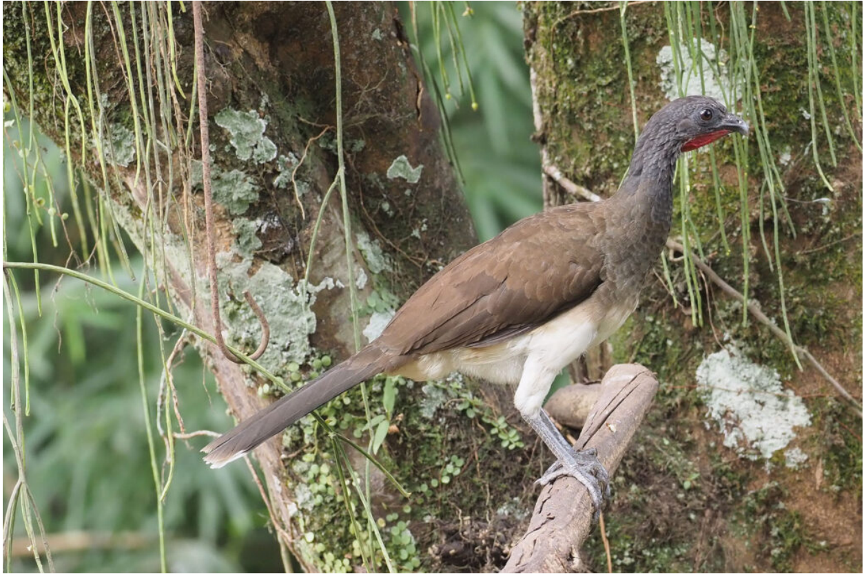
White-bellied Chachalaca