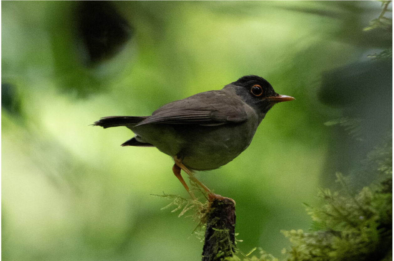
Black-headed Nightingale-Thrush