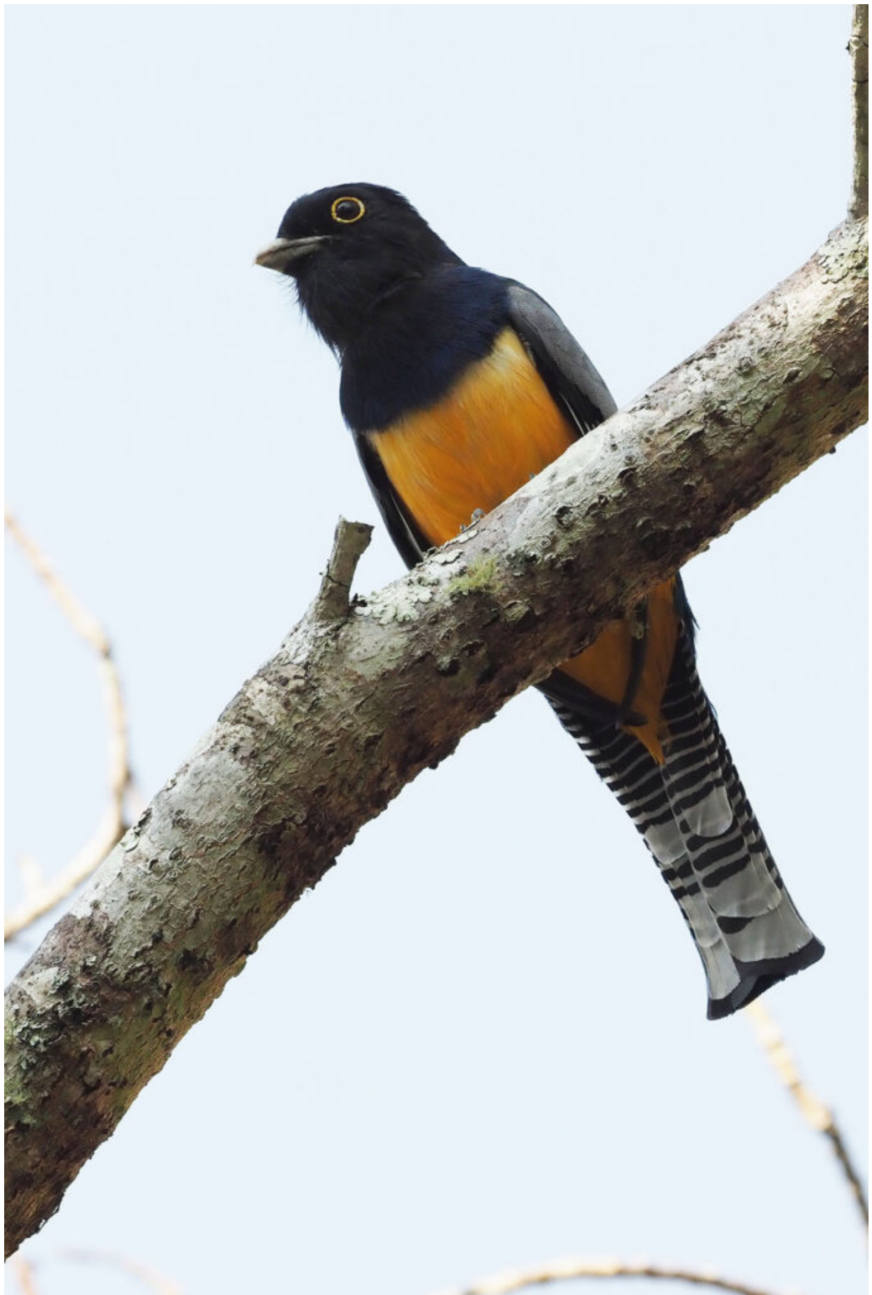
Gartered Trogon