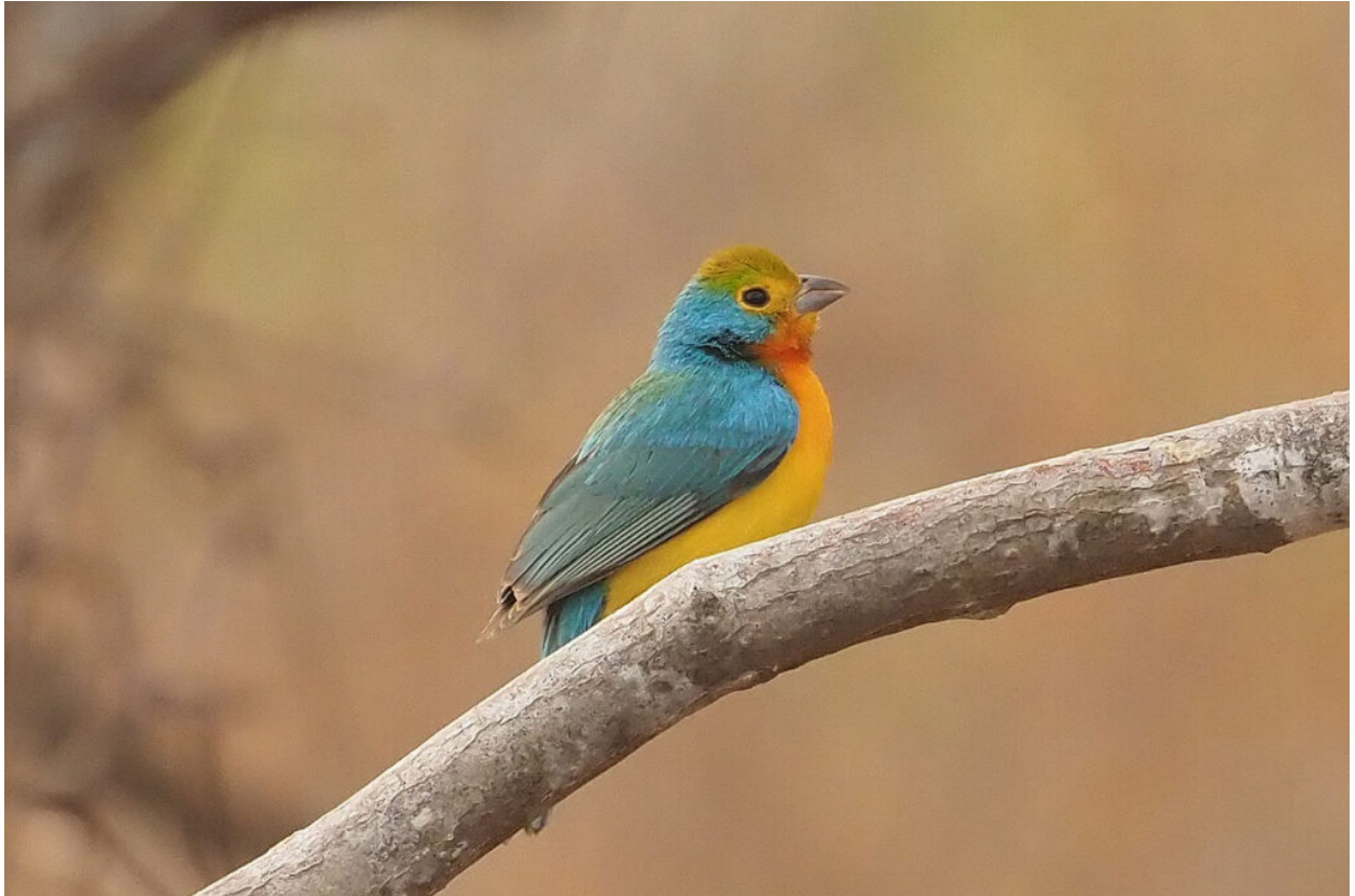
Orange-breasted Bunting