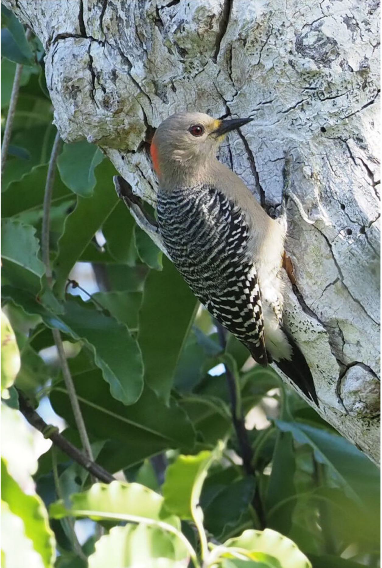
Yucatan Woodpecker