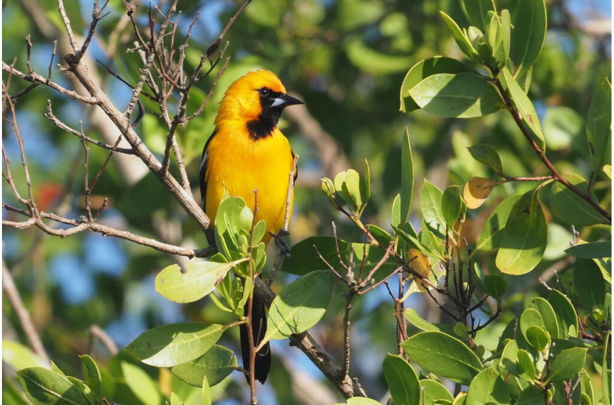
Orange Oriole