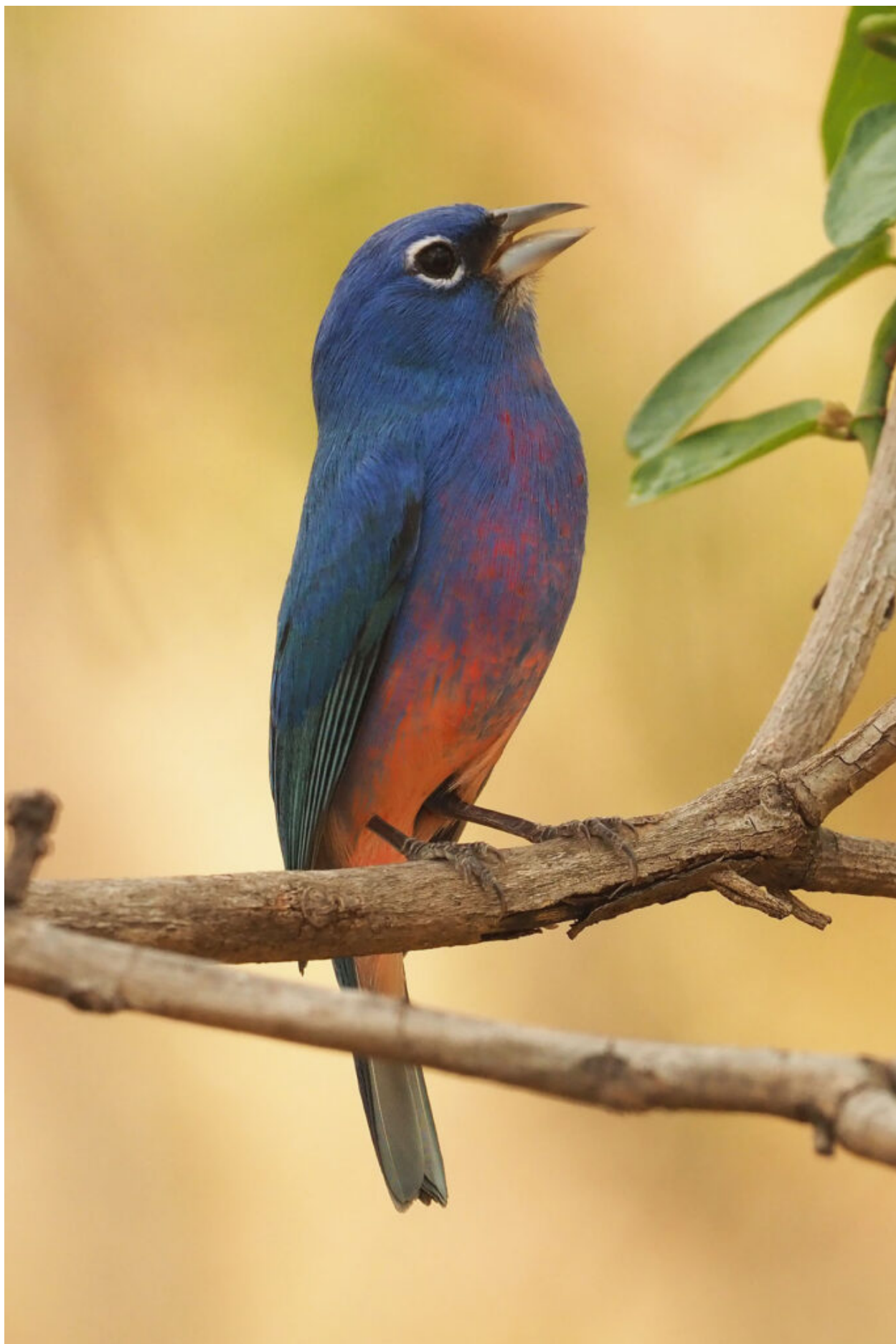
Rose-bellied (Rosita's) Bunting