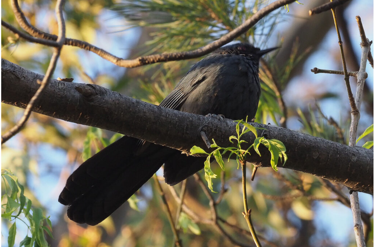
Blue Mockingbird