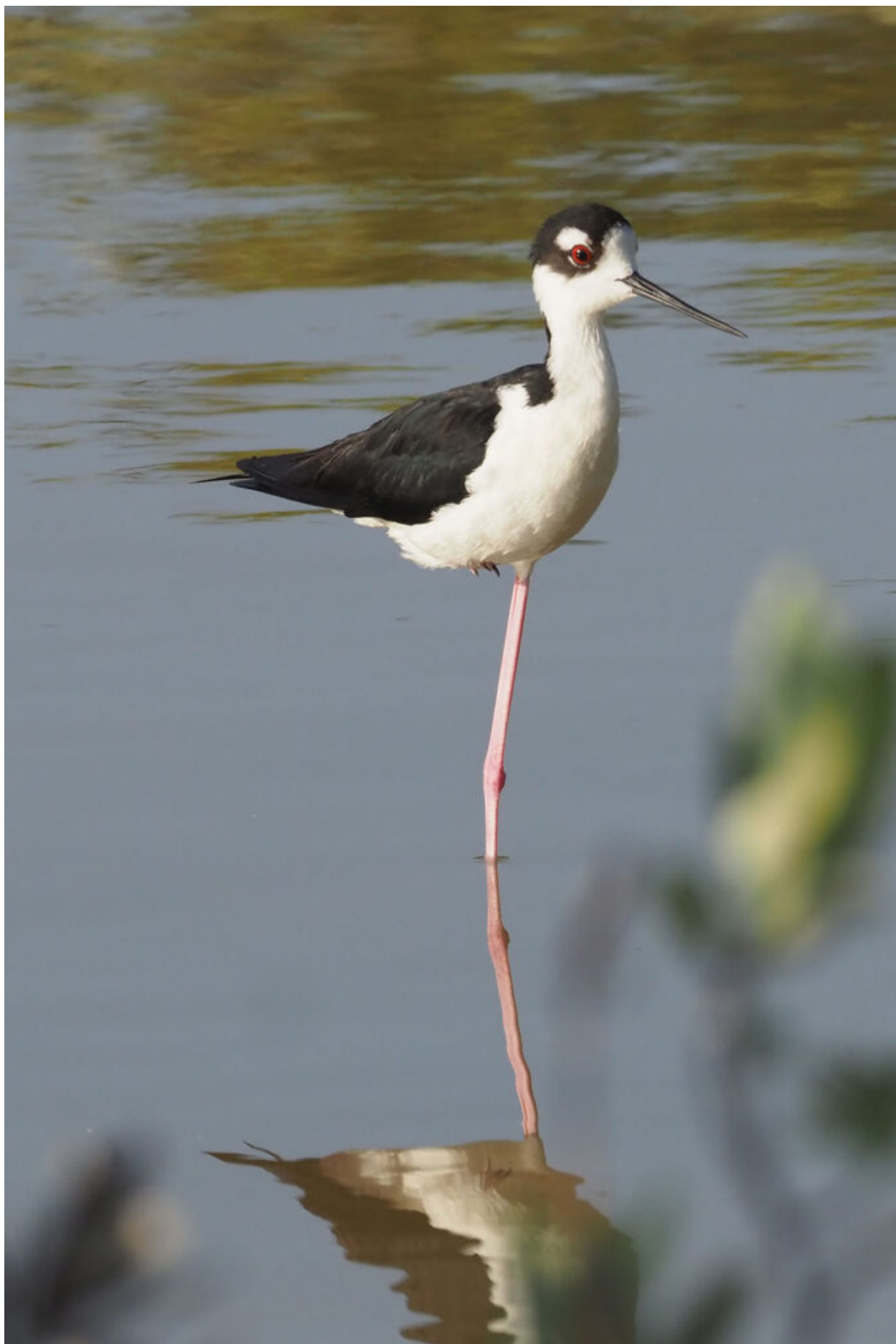
Black-necked Stilt