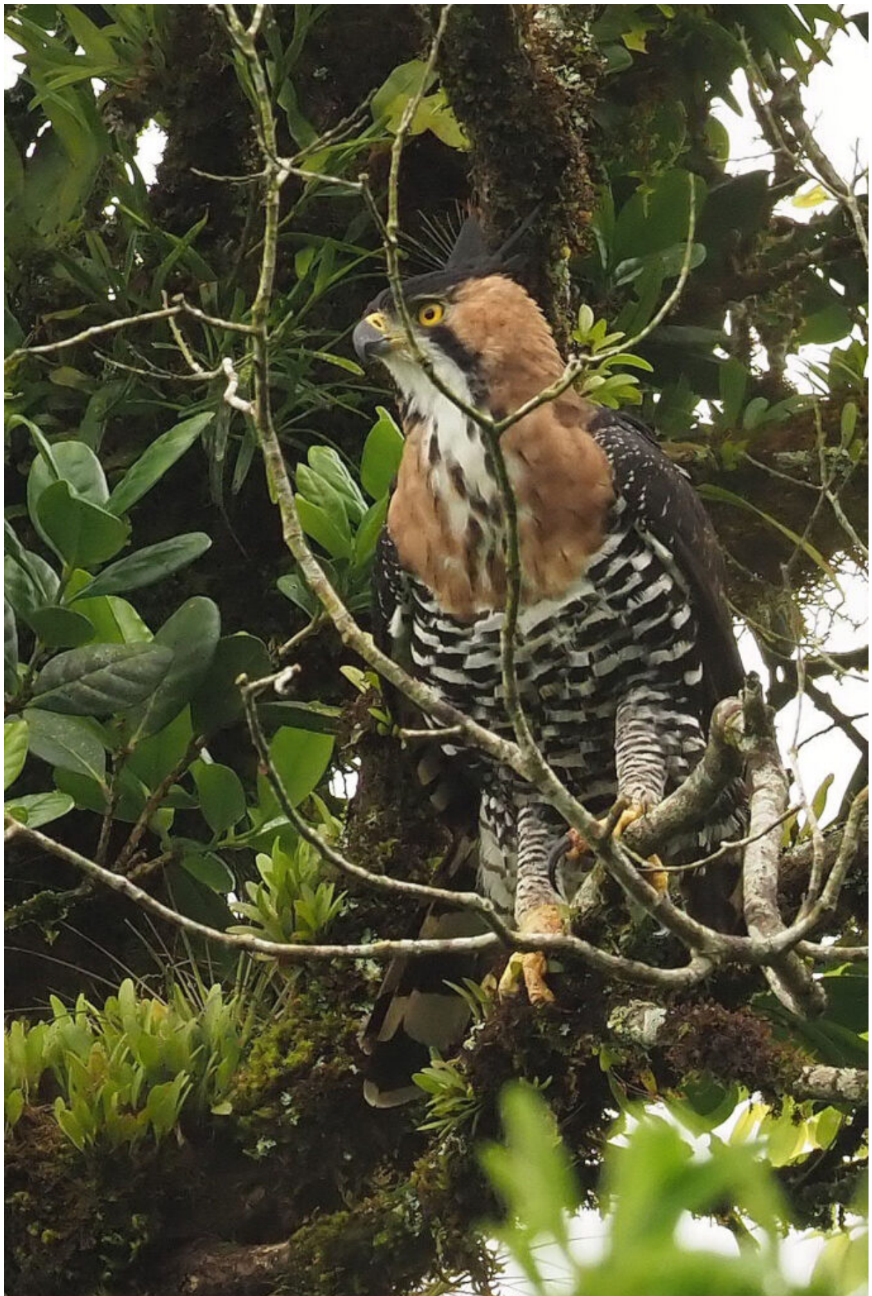
Ornate Hawk-Eagle