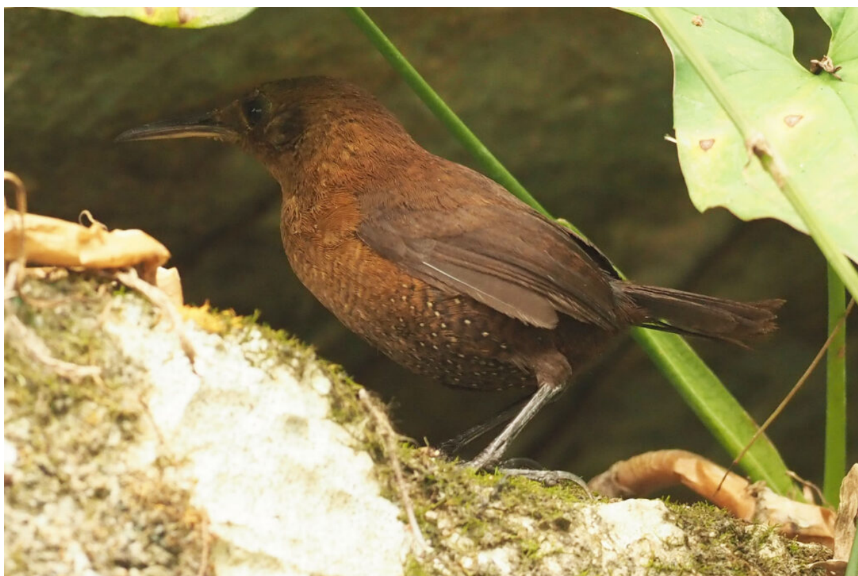
Sumichrast's Wren