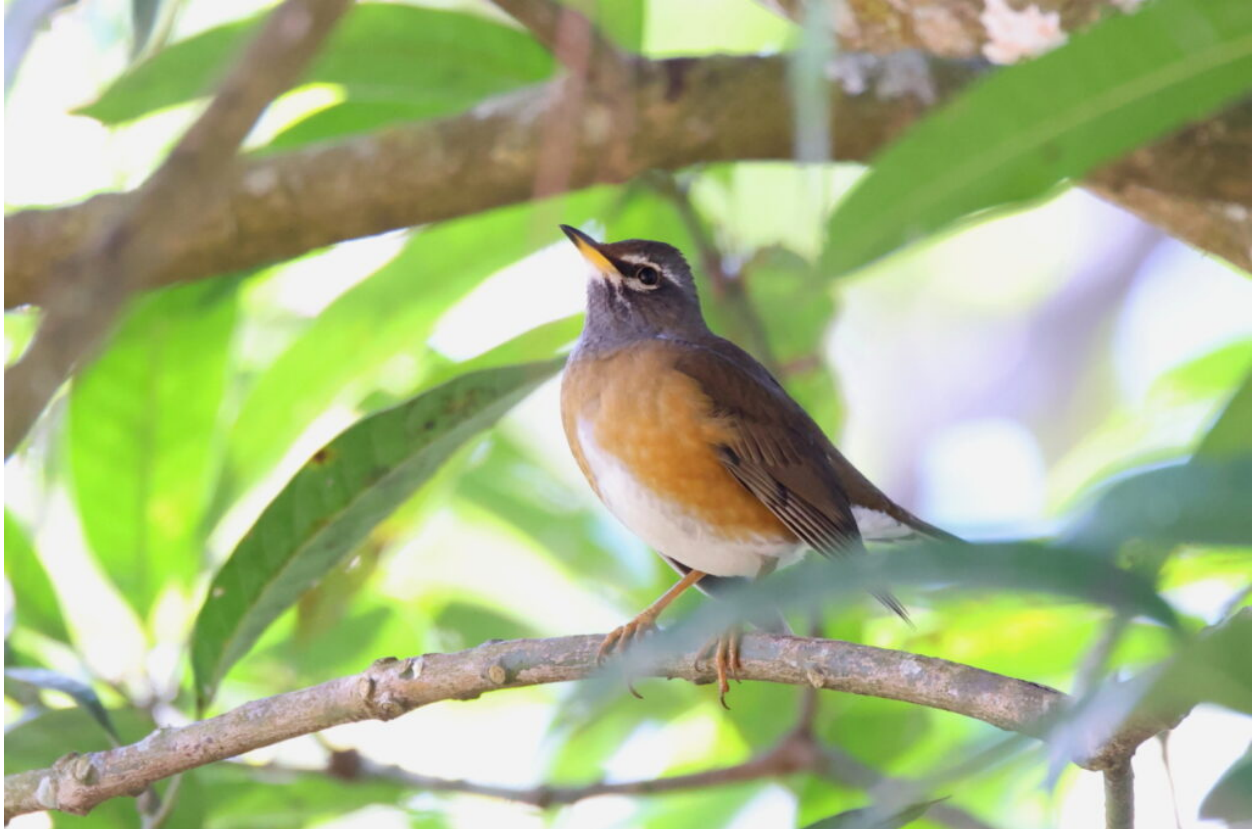
Eye-browed Thrush