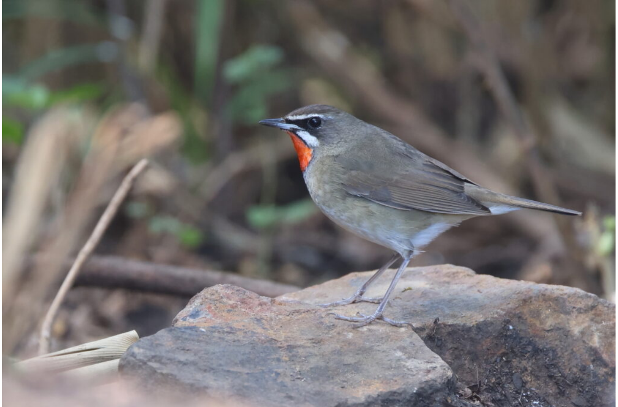
male Siberian Rubythroat