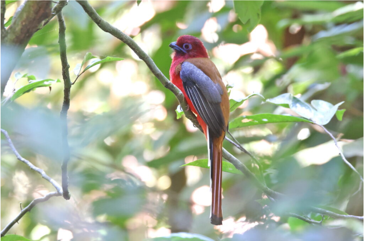
male Red-headed Trogon