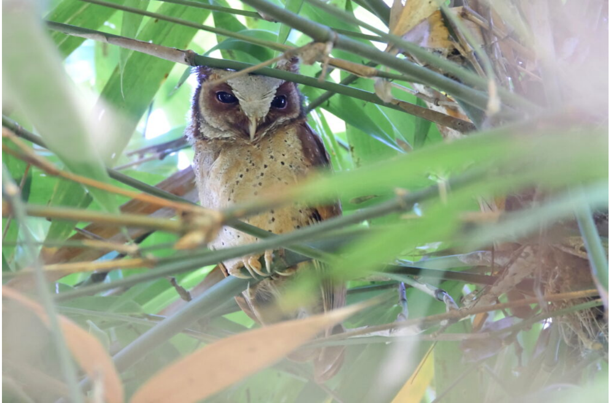
White-fronted Scops Owl