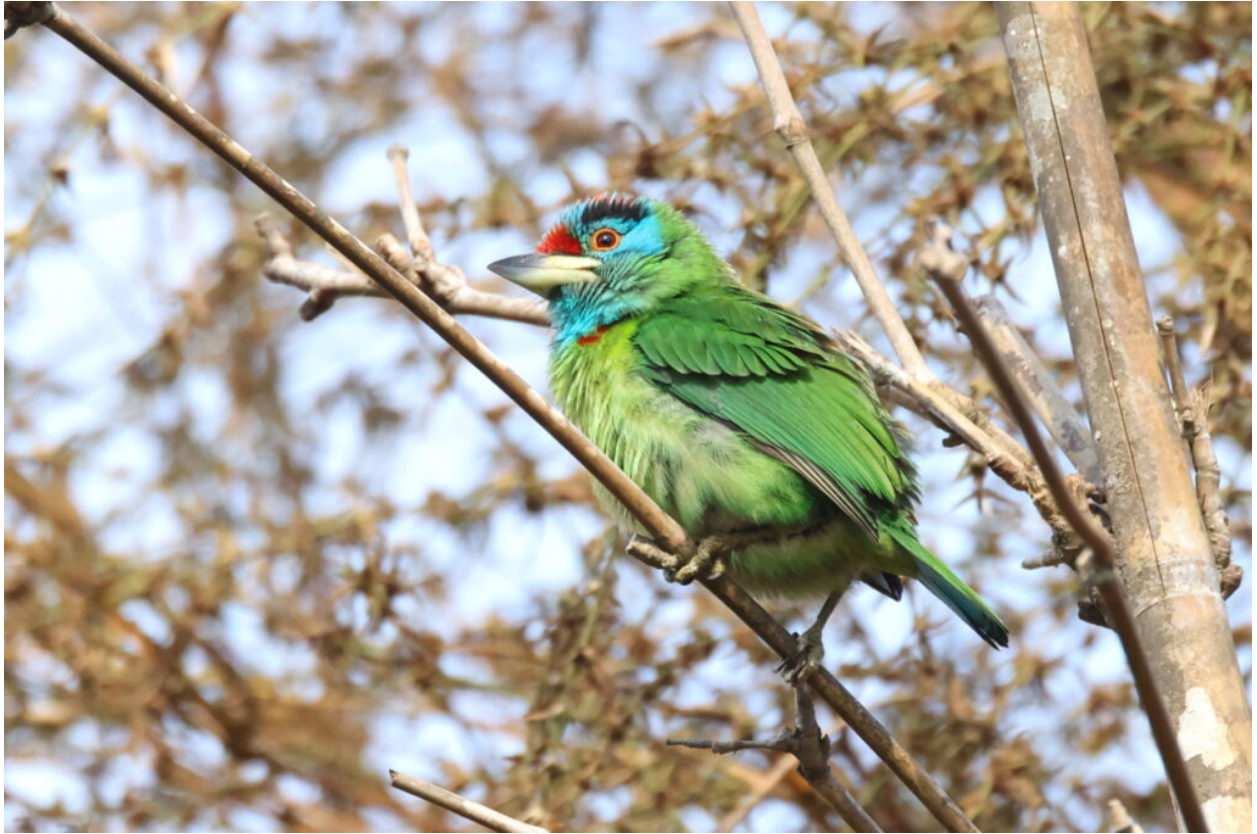
Blue-throated Barbet