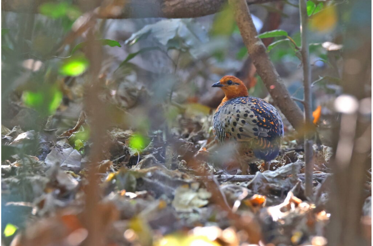
Ferruginous Partridge