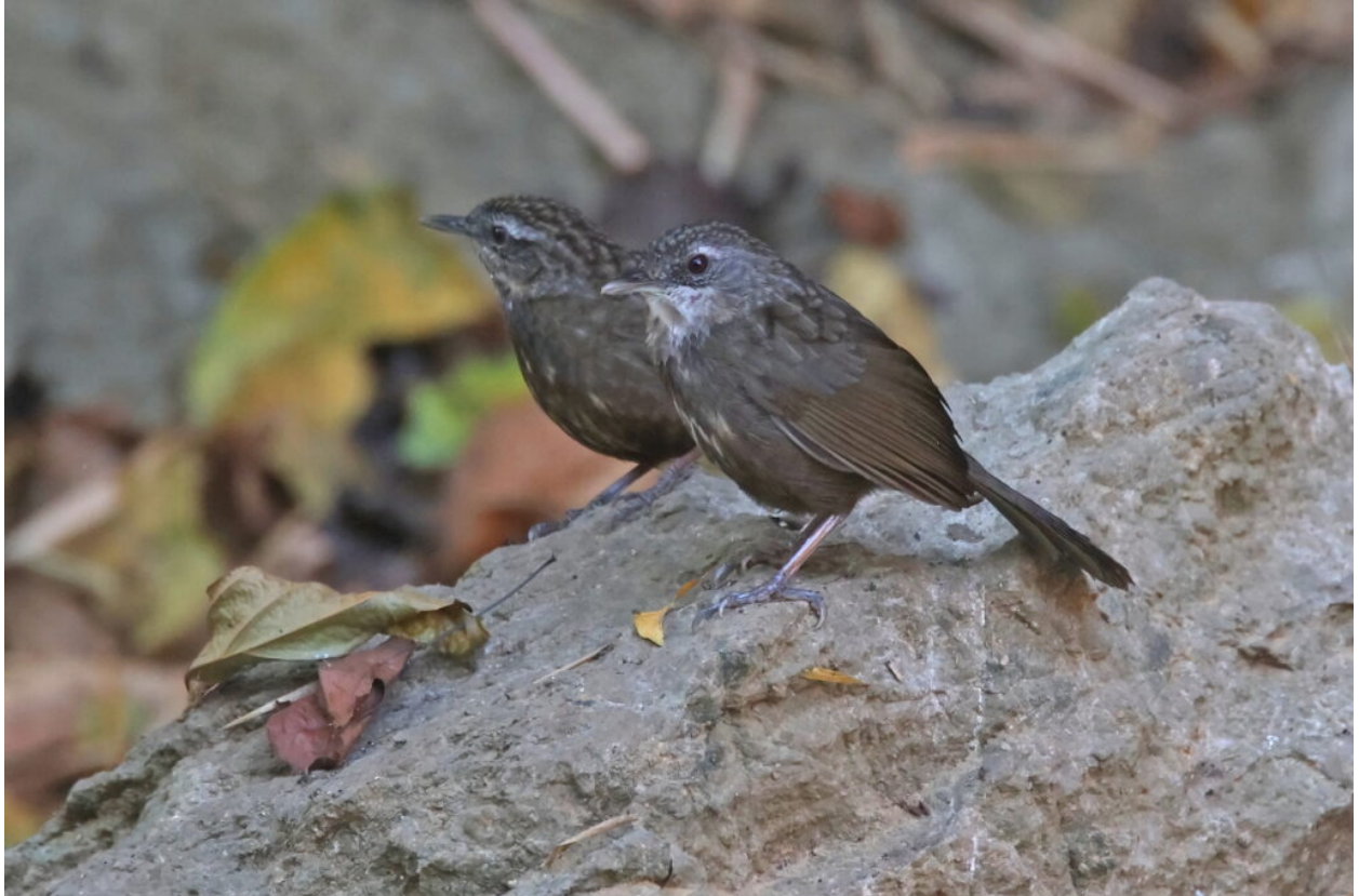
Variable Limestone Babblers (image by János Oláh)