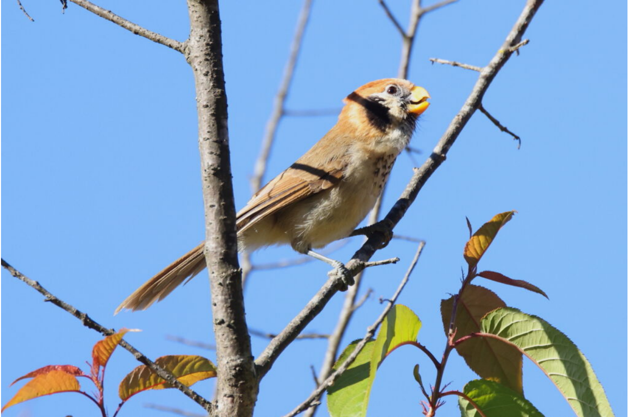
Spot-breasted Parrotbill (image by János Oláh)