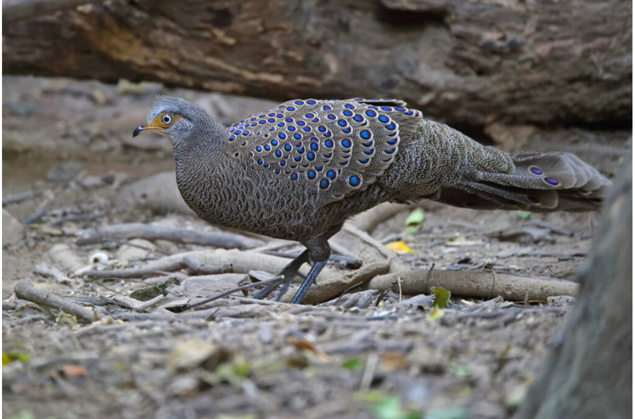
male Grey Peacock-Pheasant