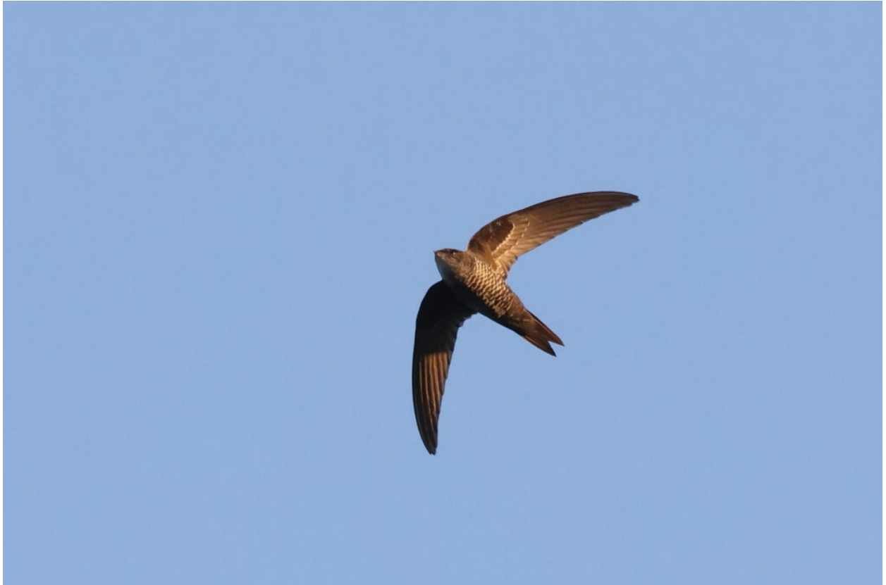
Cook's Swift