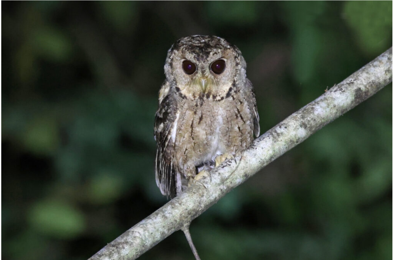
Collared Scops Owl