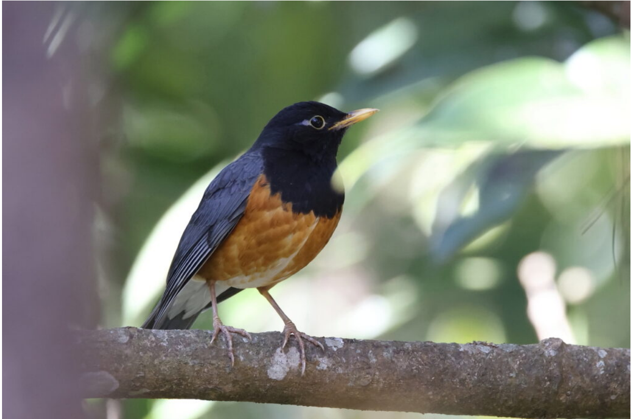
Black-breasted Thrush