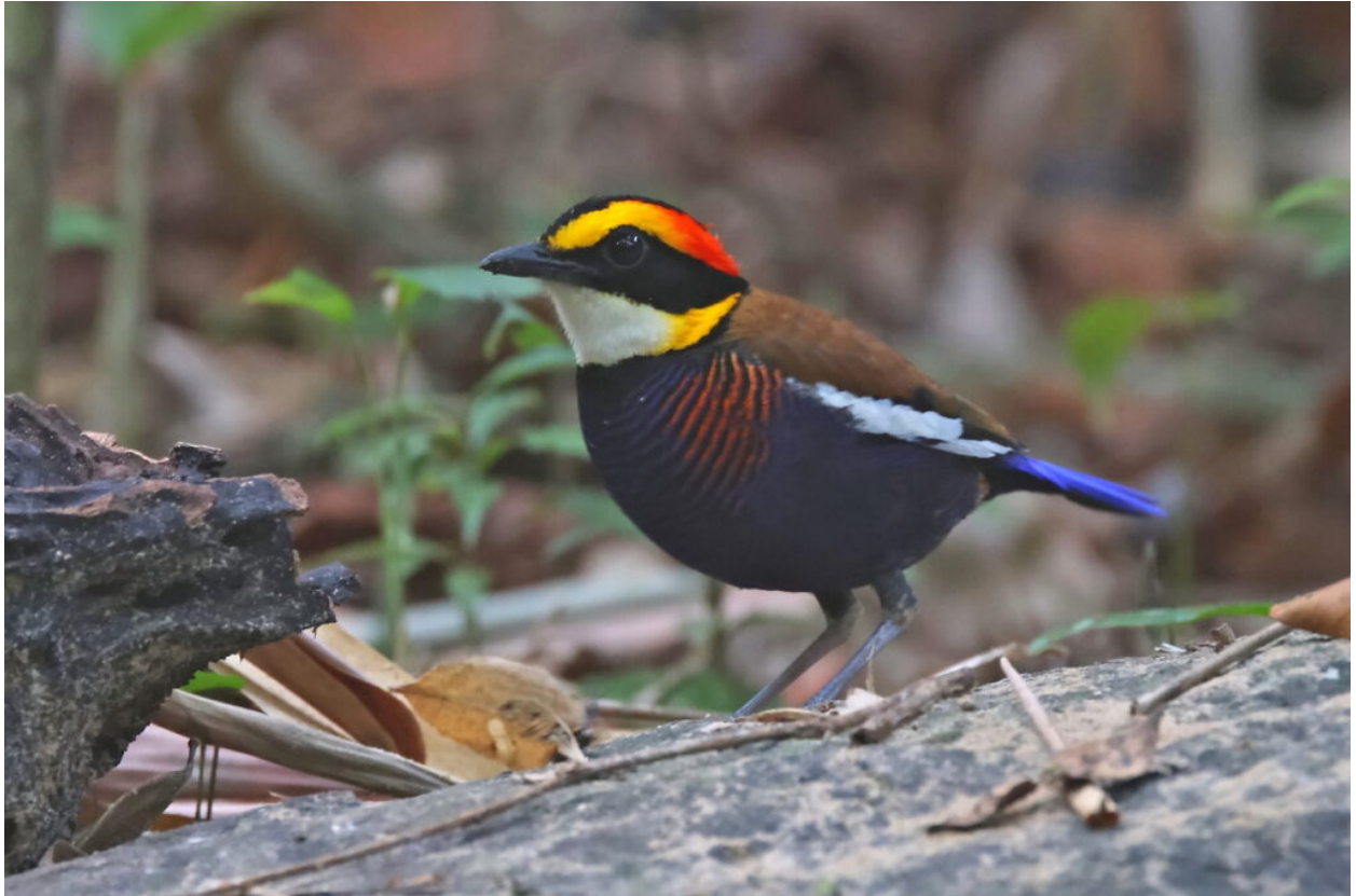
Malayan Banded Pitta