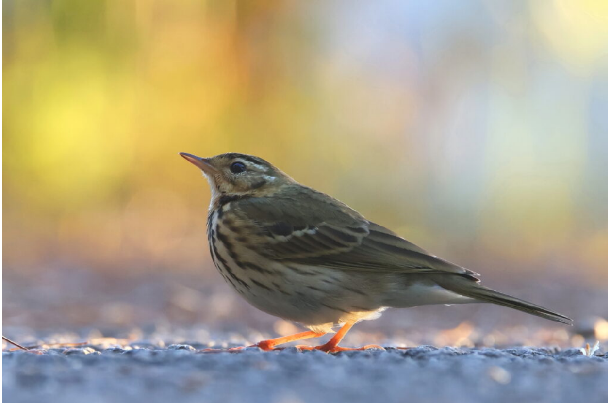
Olive-backed Pipit