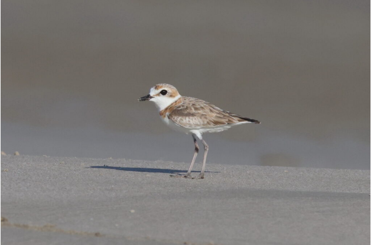
female Malaysian Plover