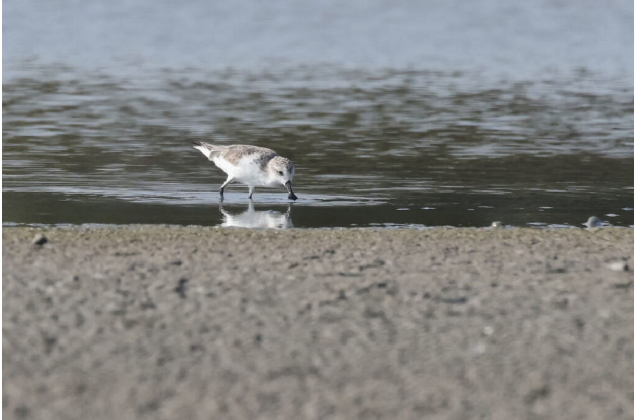
Spoon-billed Sandpiper