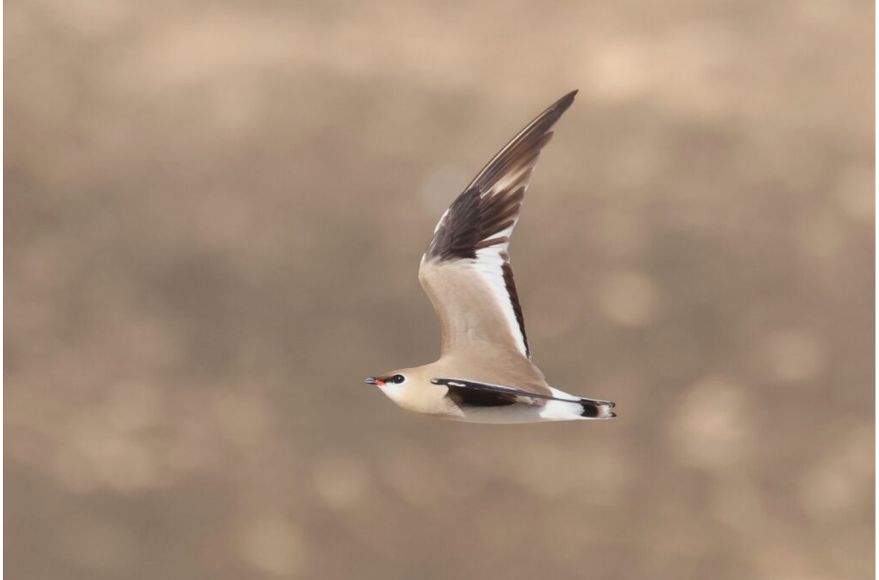
Small Pratincole