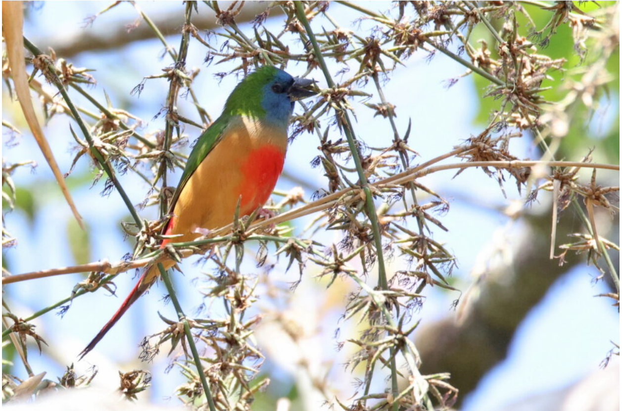
male Pin-tailed Parrotfinch