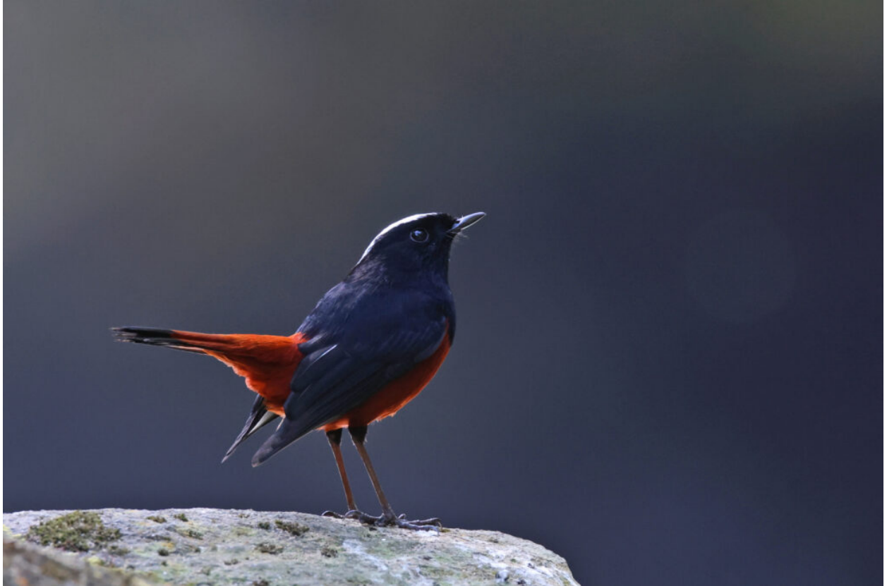
White-capped Redstart