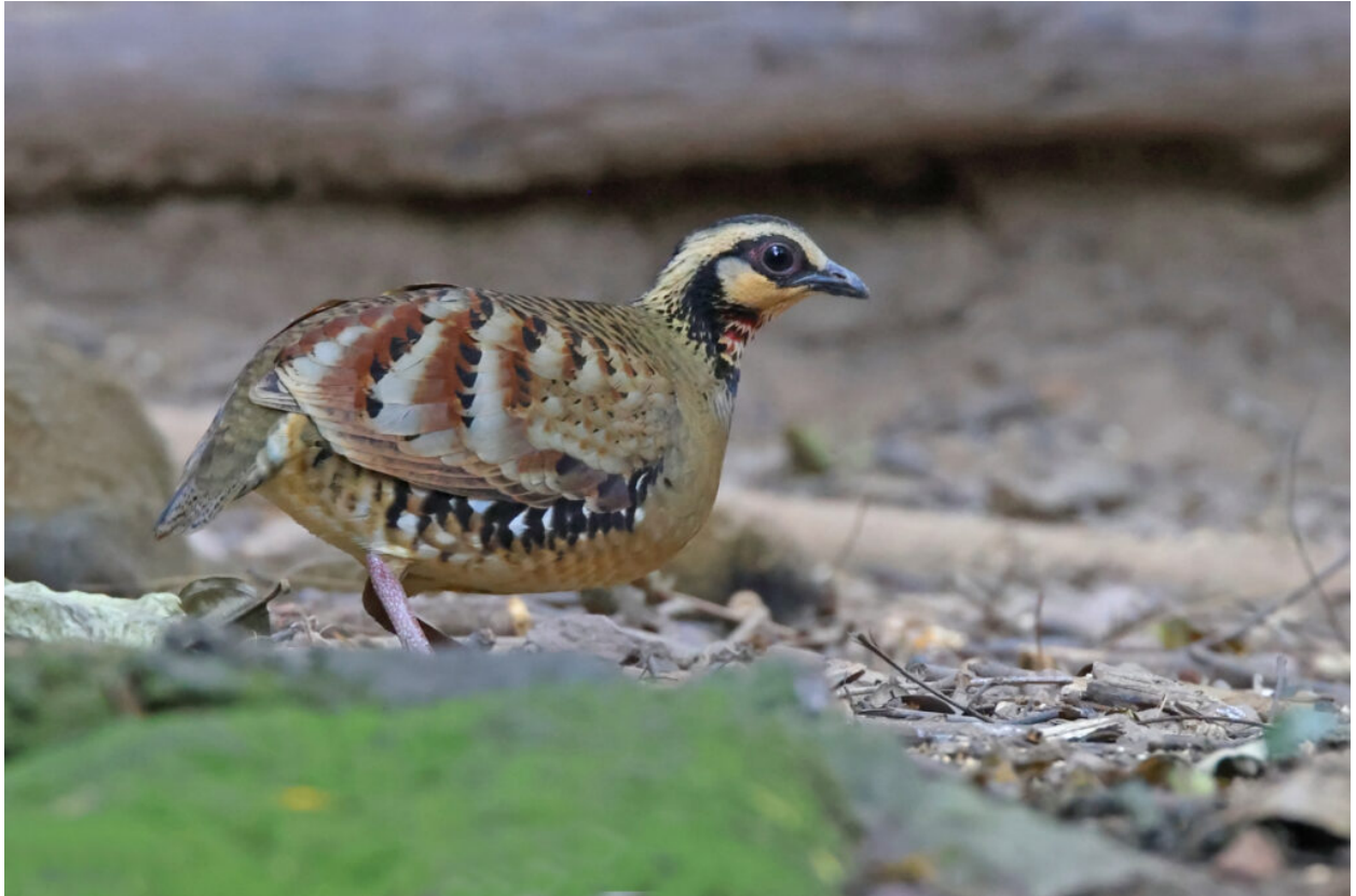
Bar-backed Partridge