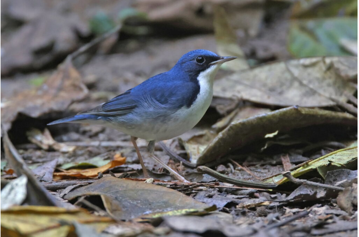
male Siberian Blue Robin