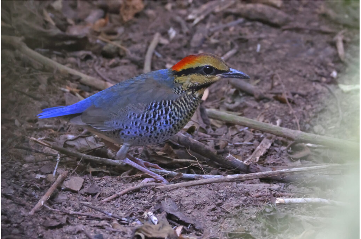
female Blue Pitta