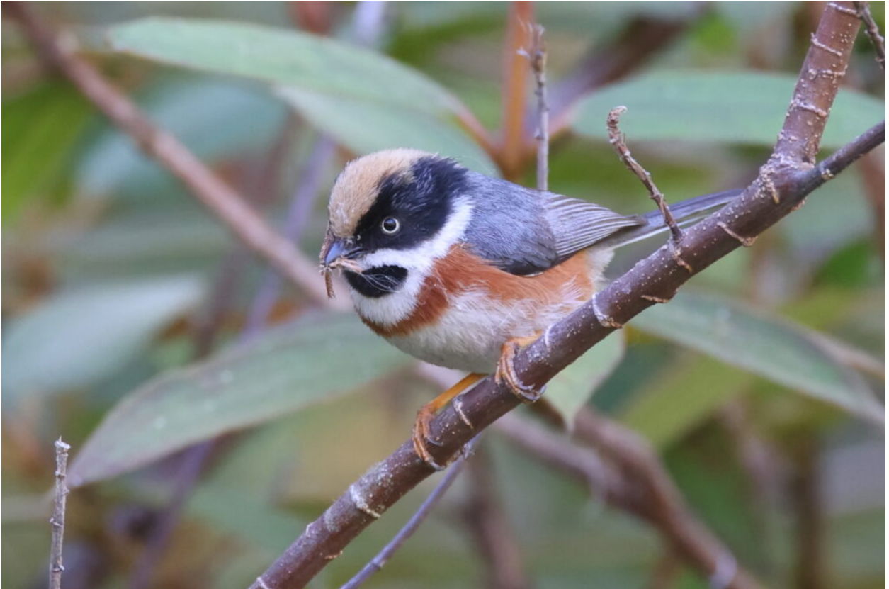
Black-throated Bushtit