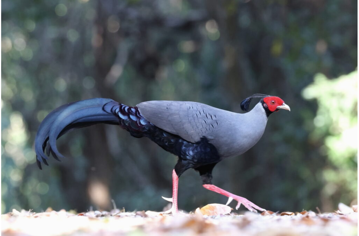
male Siamese Fireback