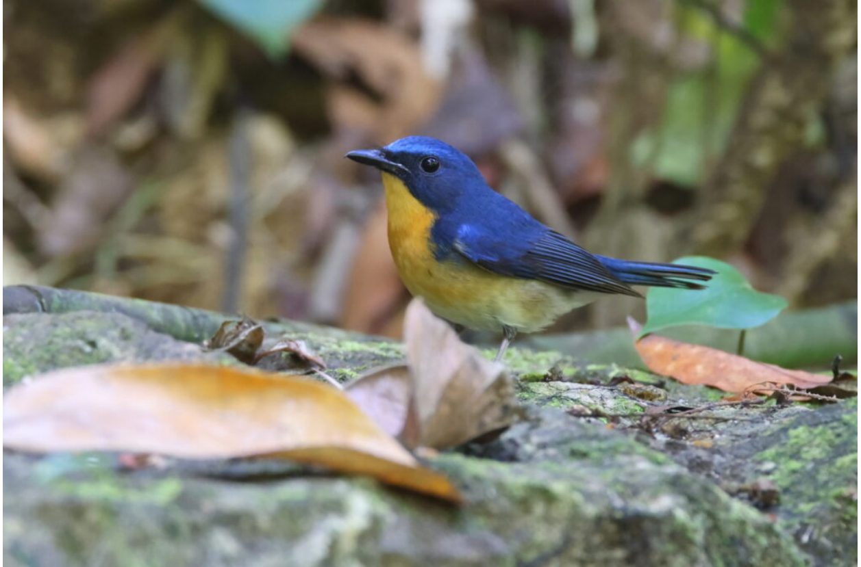
male Large Blue Flycatcher