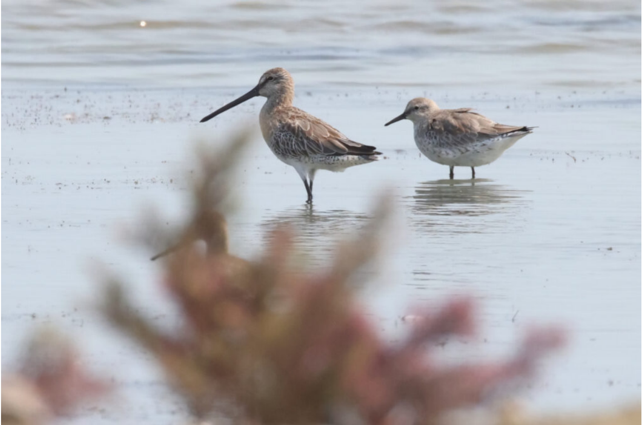
Asian Dowitcher and Great Knot