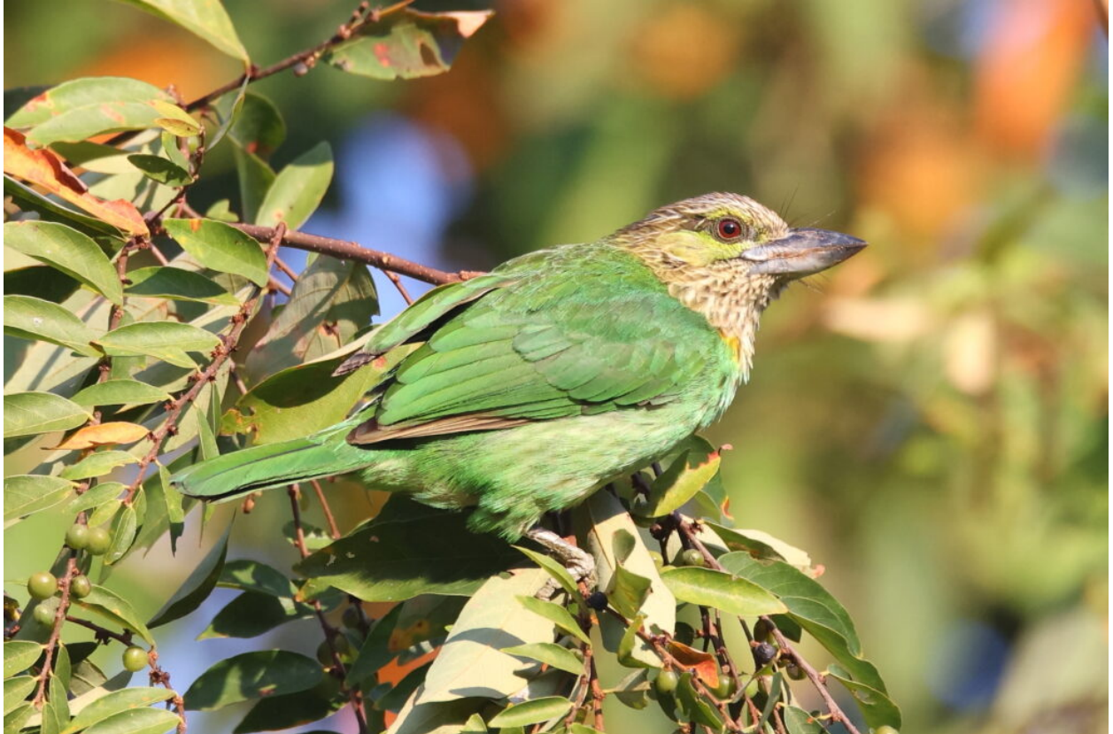
Green-eared Barbet