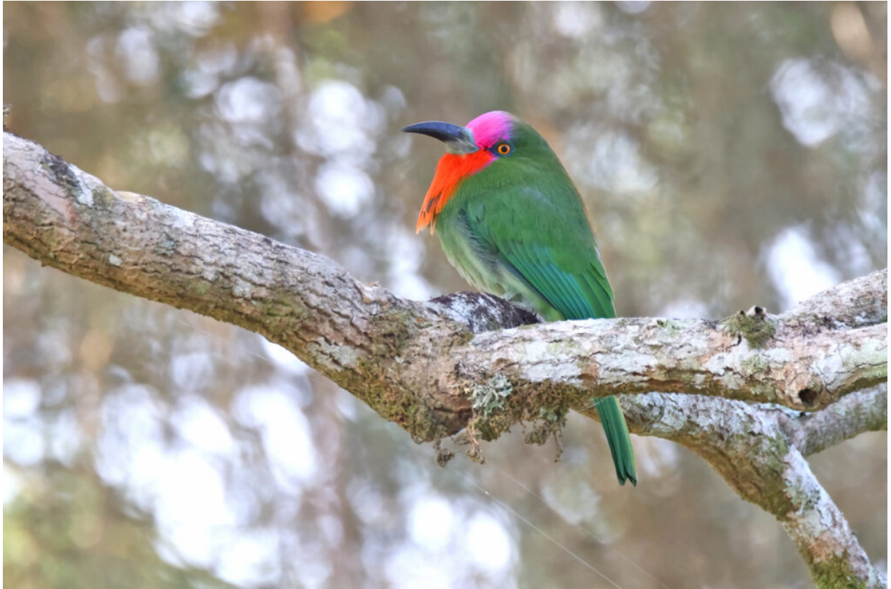
Red-bearded Bee-eater