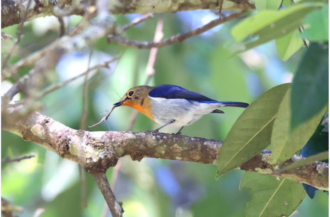
Sapphire Flycatcher, a male in winter plumage