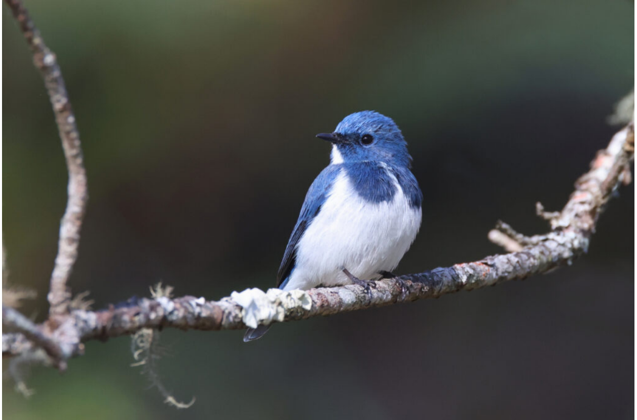
male Ultramarine Flycatcher