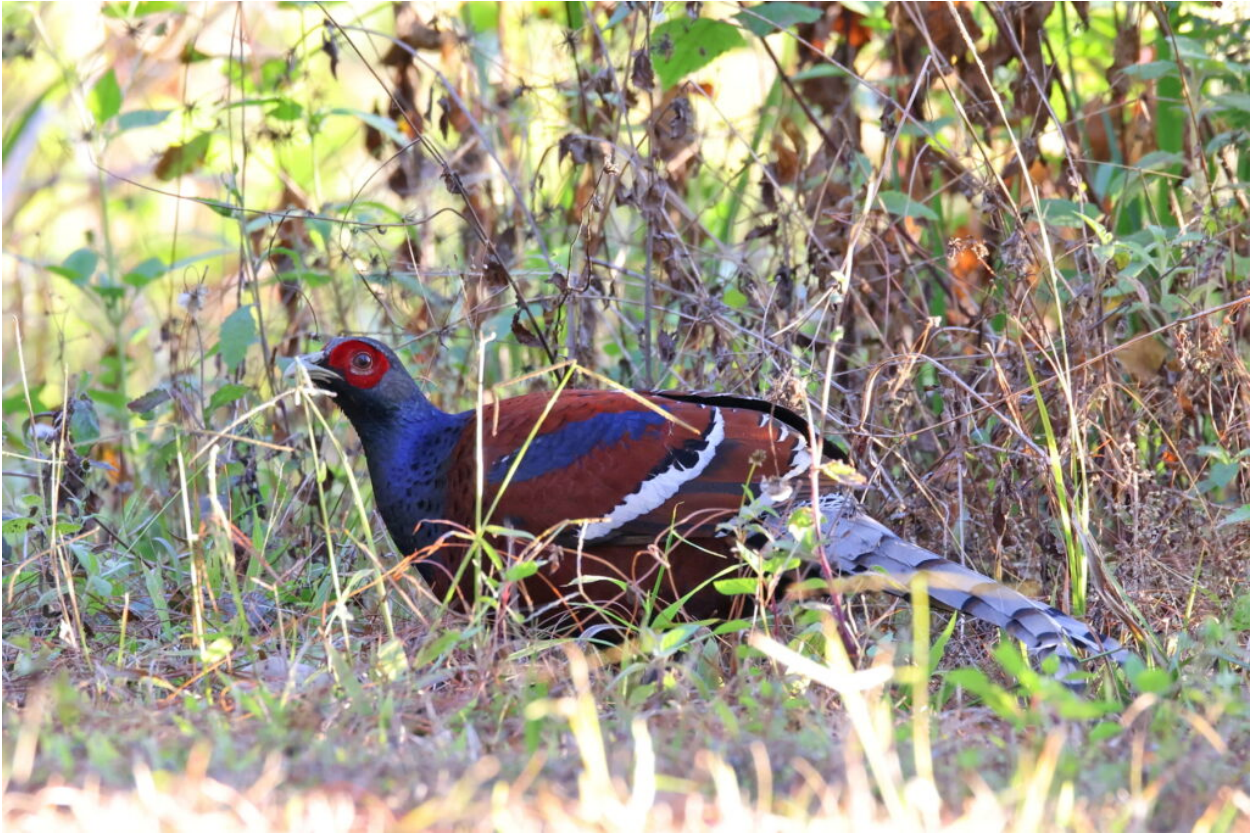
male Mrs Hume's Pheasant