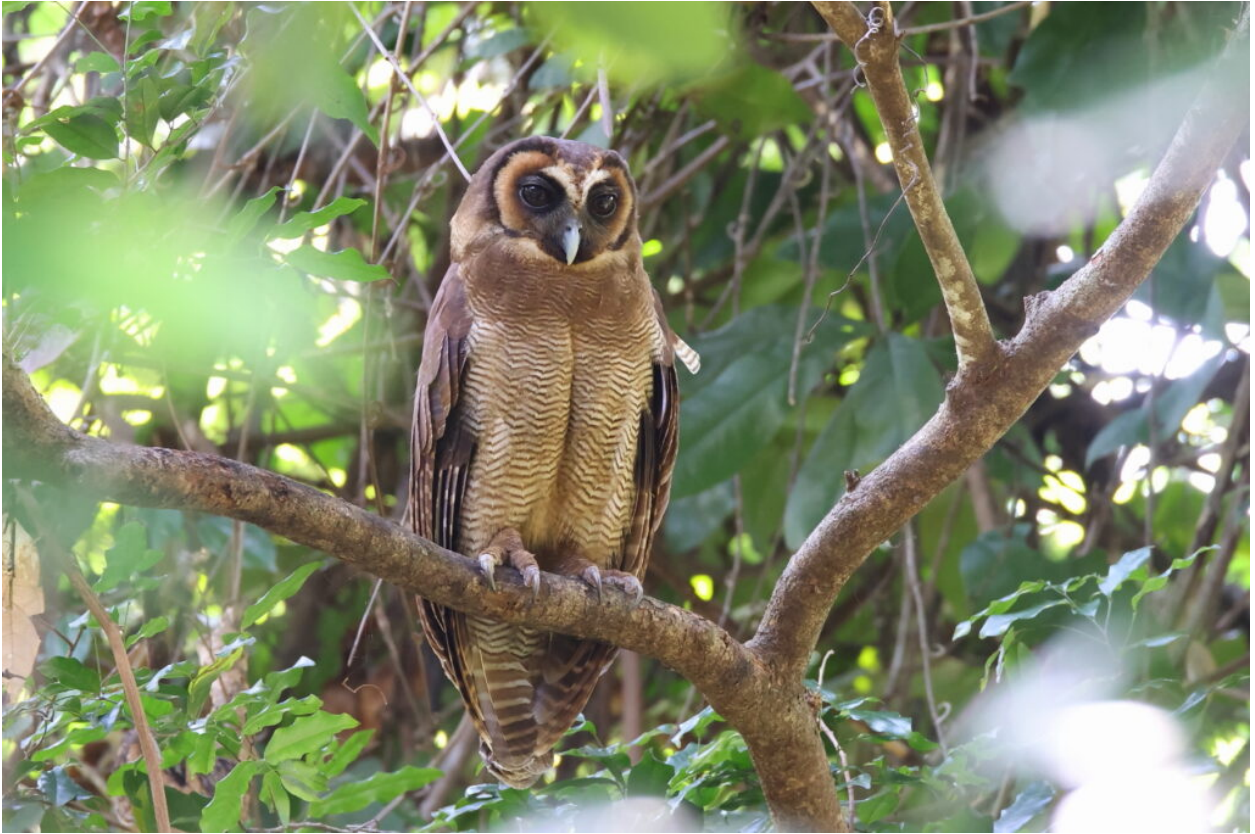
Brown Wood Owl