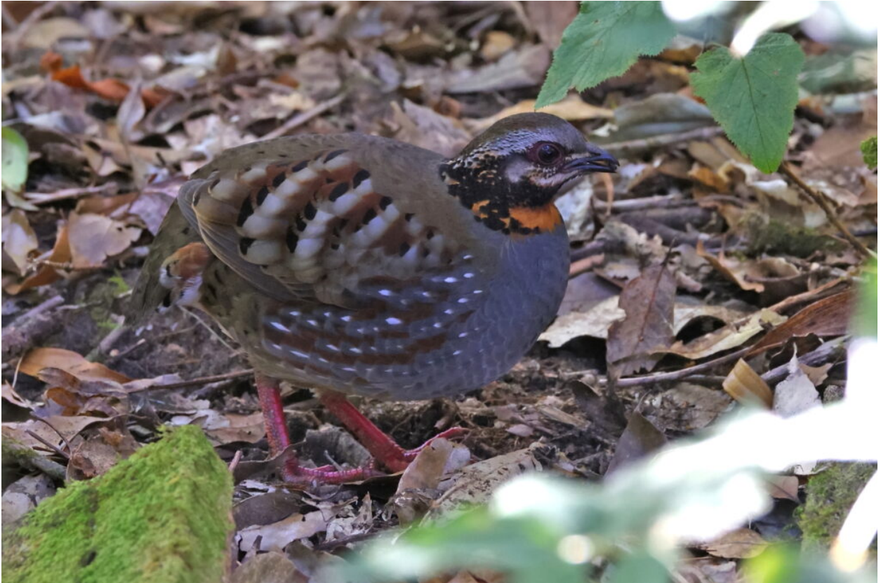
Rufous-throated Partridge