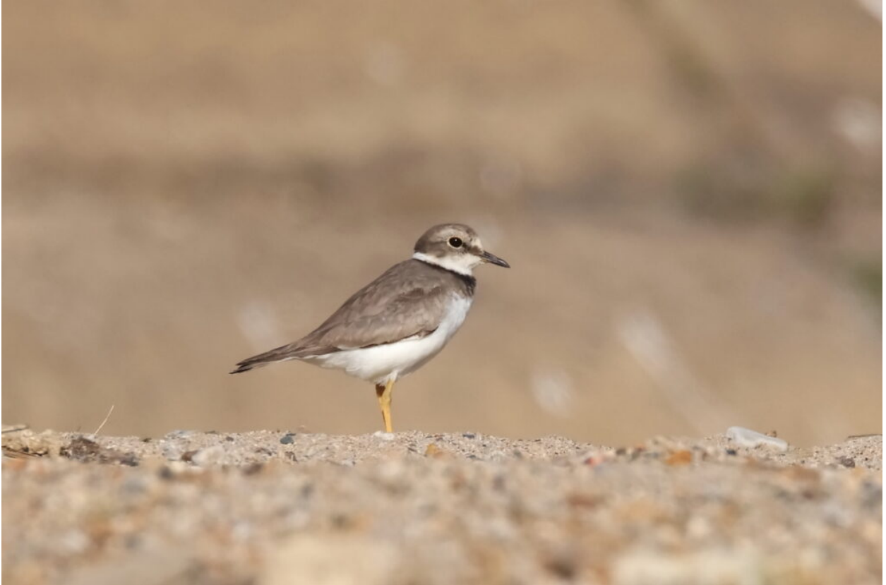
Long-billed Plover