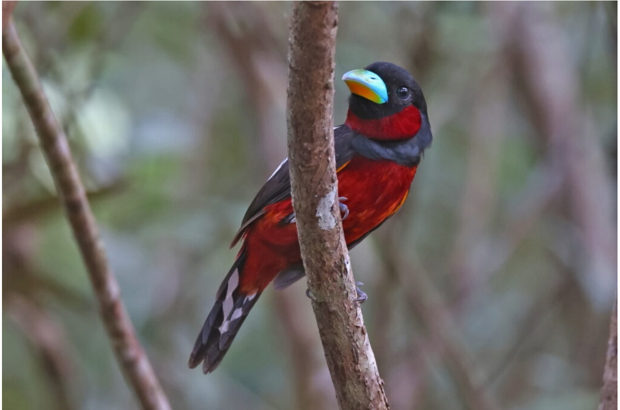
Black-and-red Broadbill