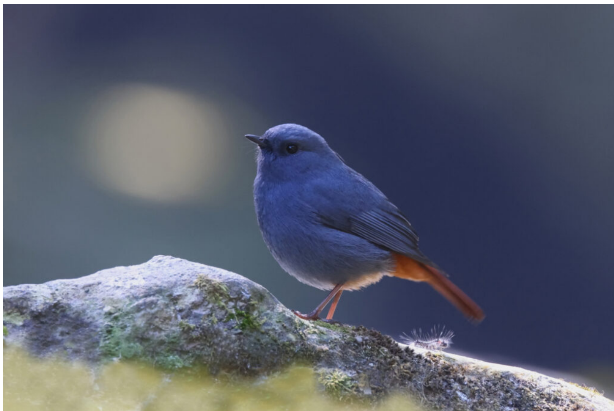
male Plumbeous Water Redstart