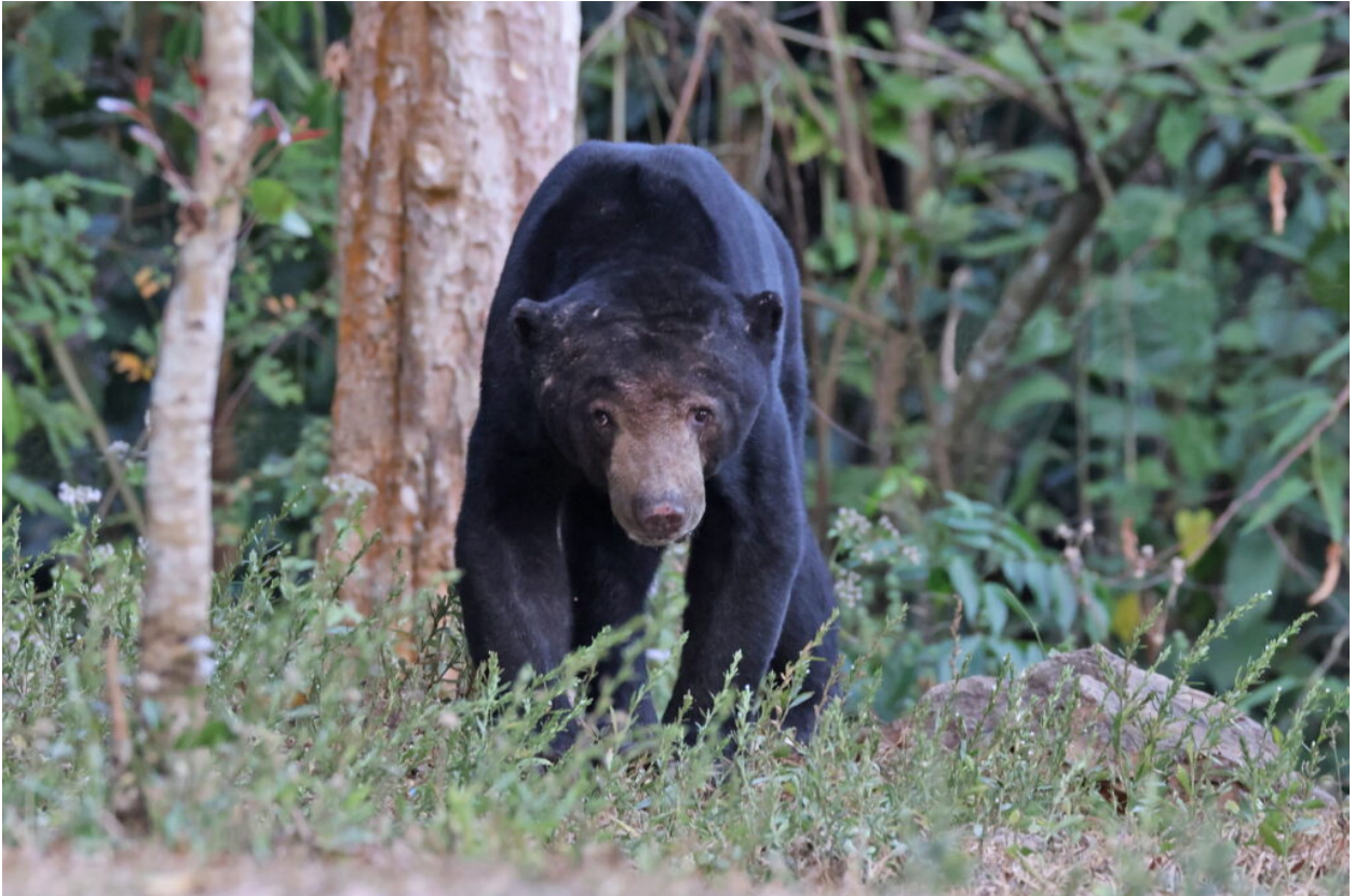
Malayan Sun Bear