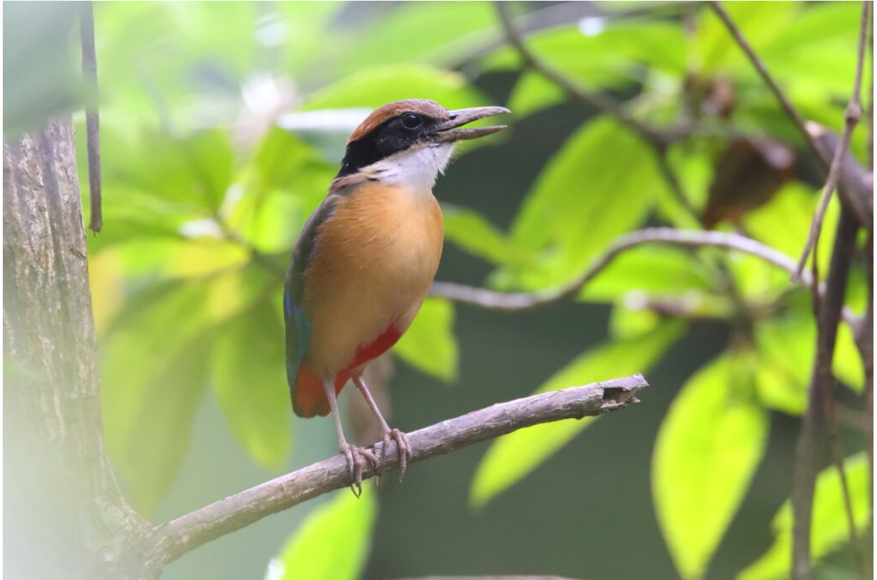
Mangrove Pitta