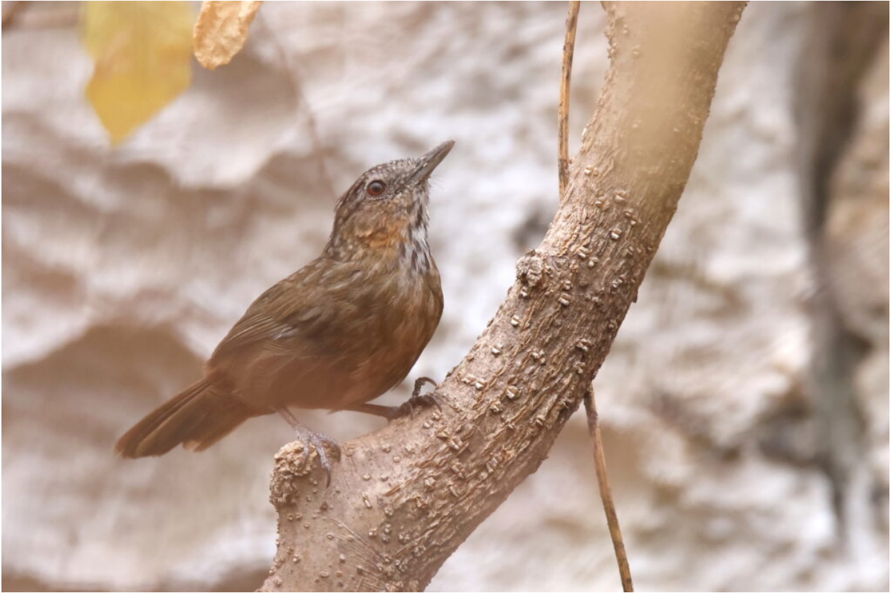
Rufous Limestone Babbler