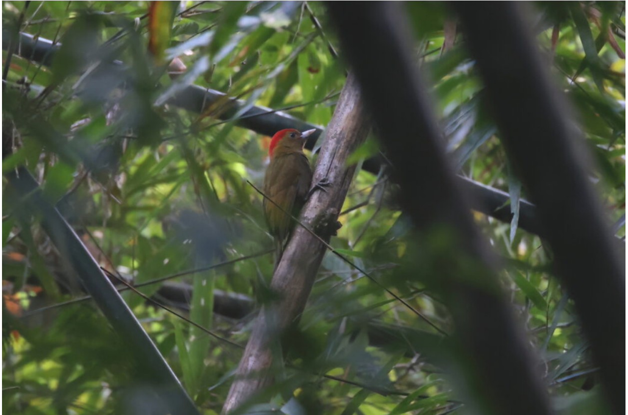
male Bamboo Woodpecker