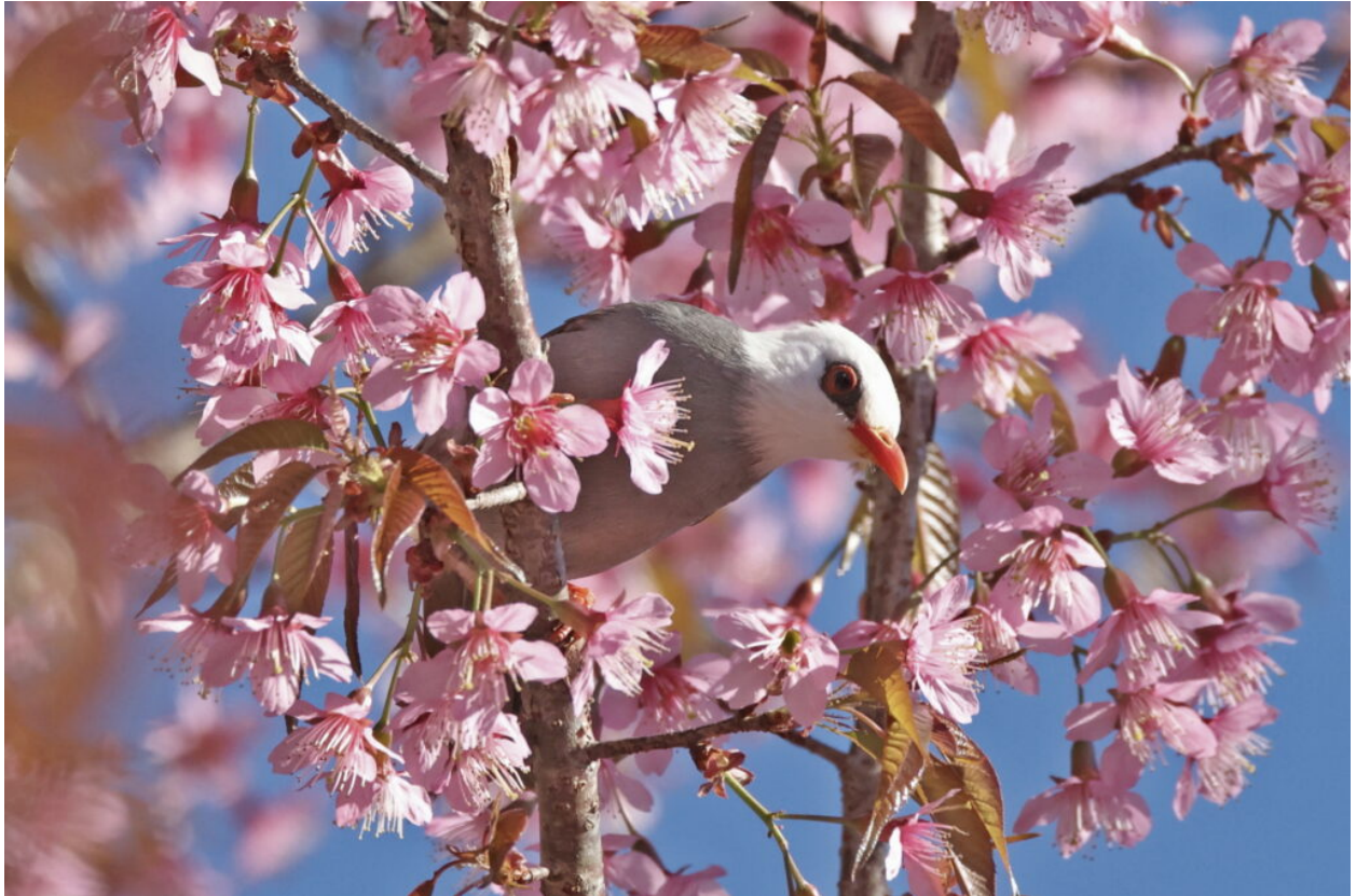
White-headed Bulbul