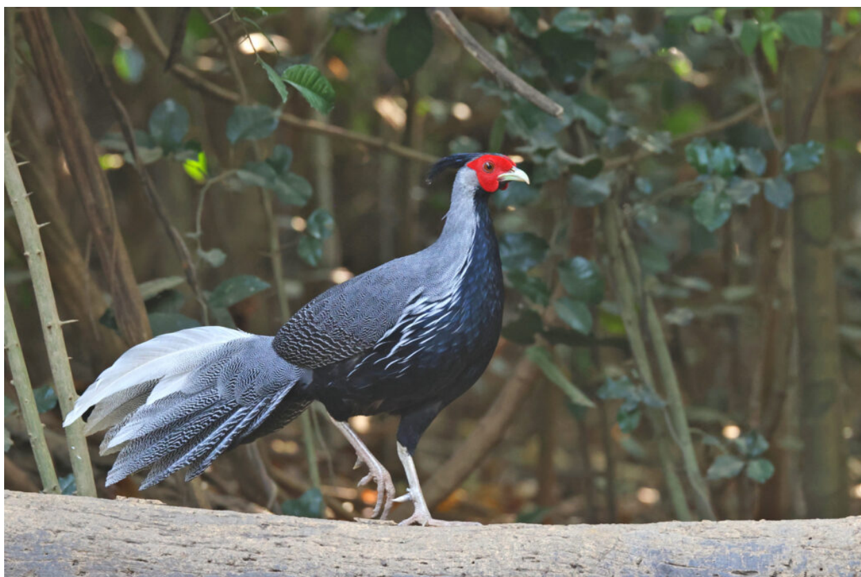
male Kalij Pheasant