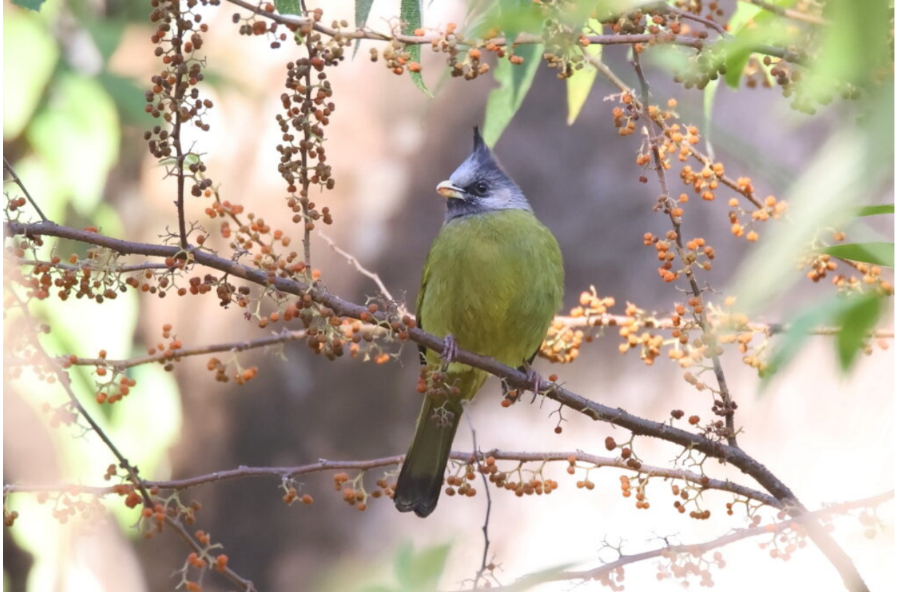
Crested Finchbill