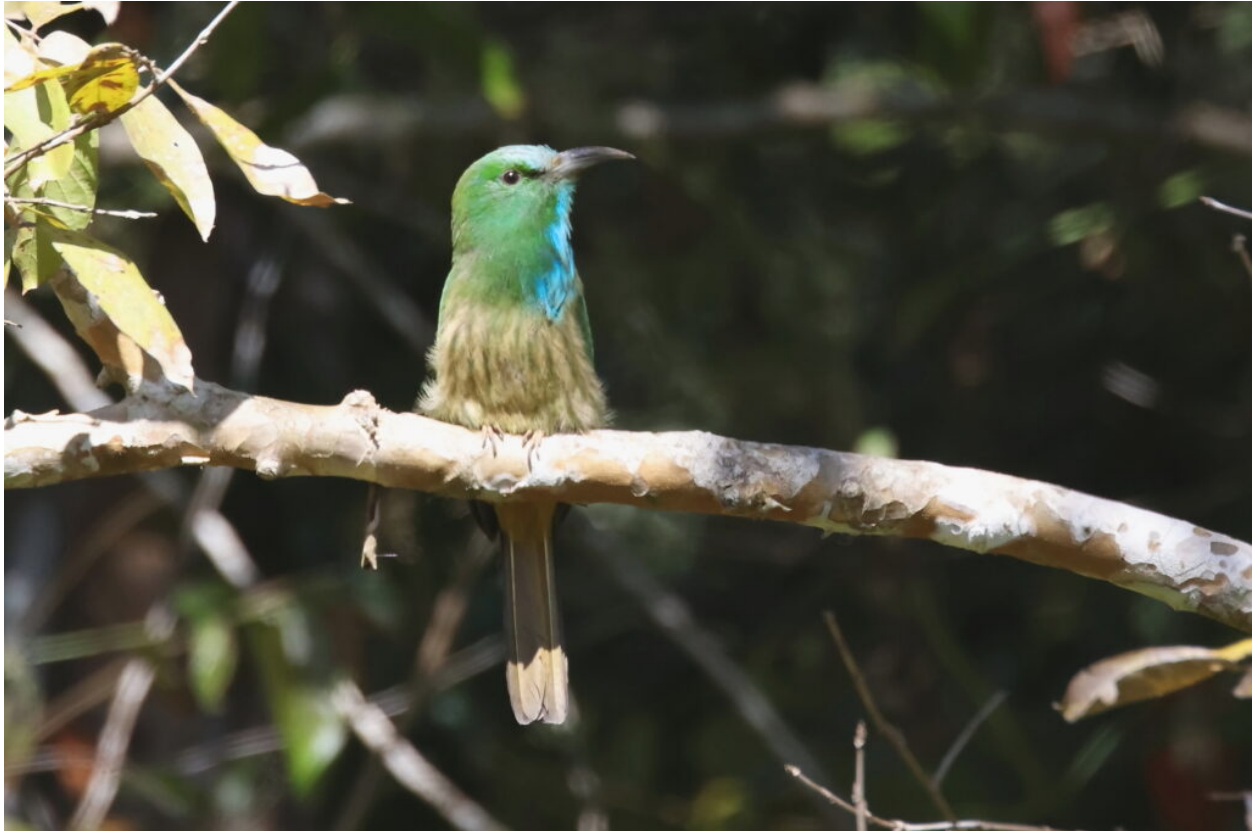
Blue-bearded Bee-eater (image by János Oláh)