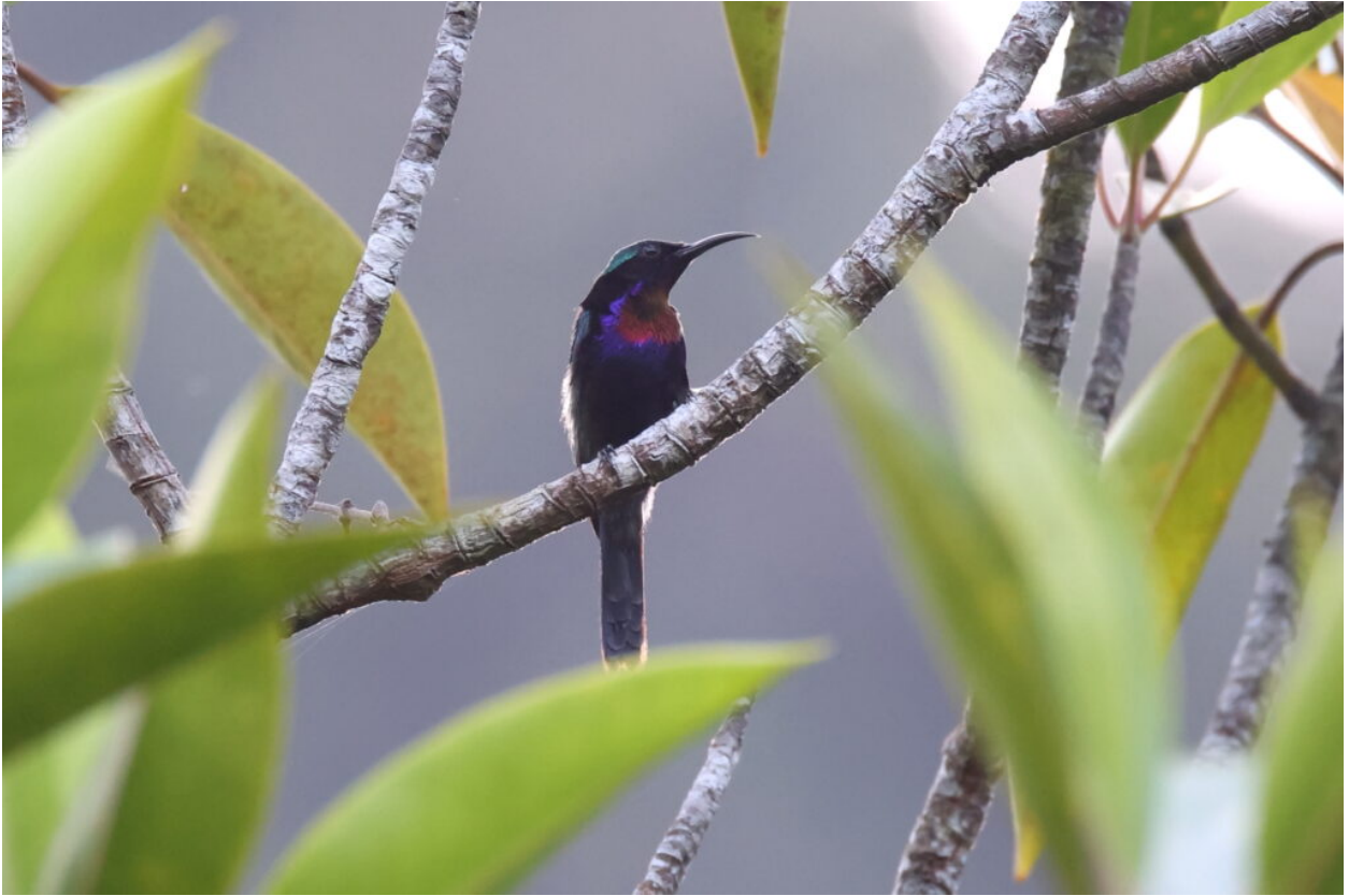
Copper-throated Sunbird