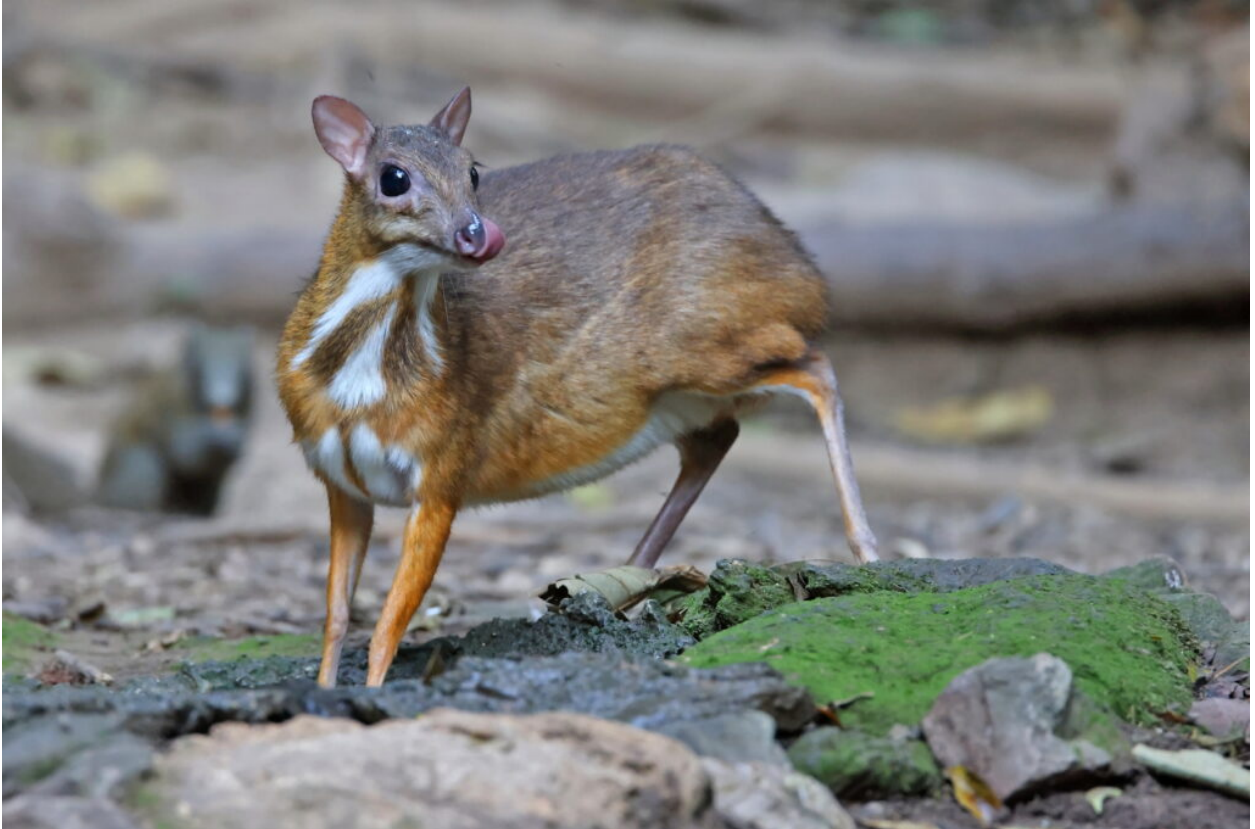
Lesser Indo-Malayan Chevrotain