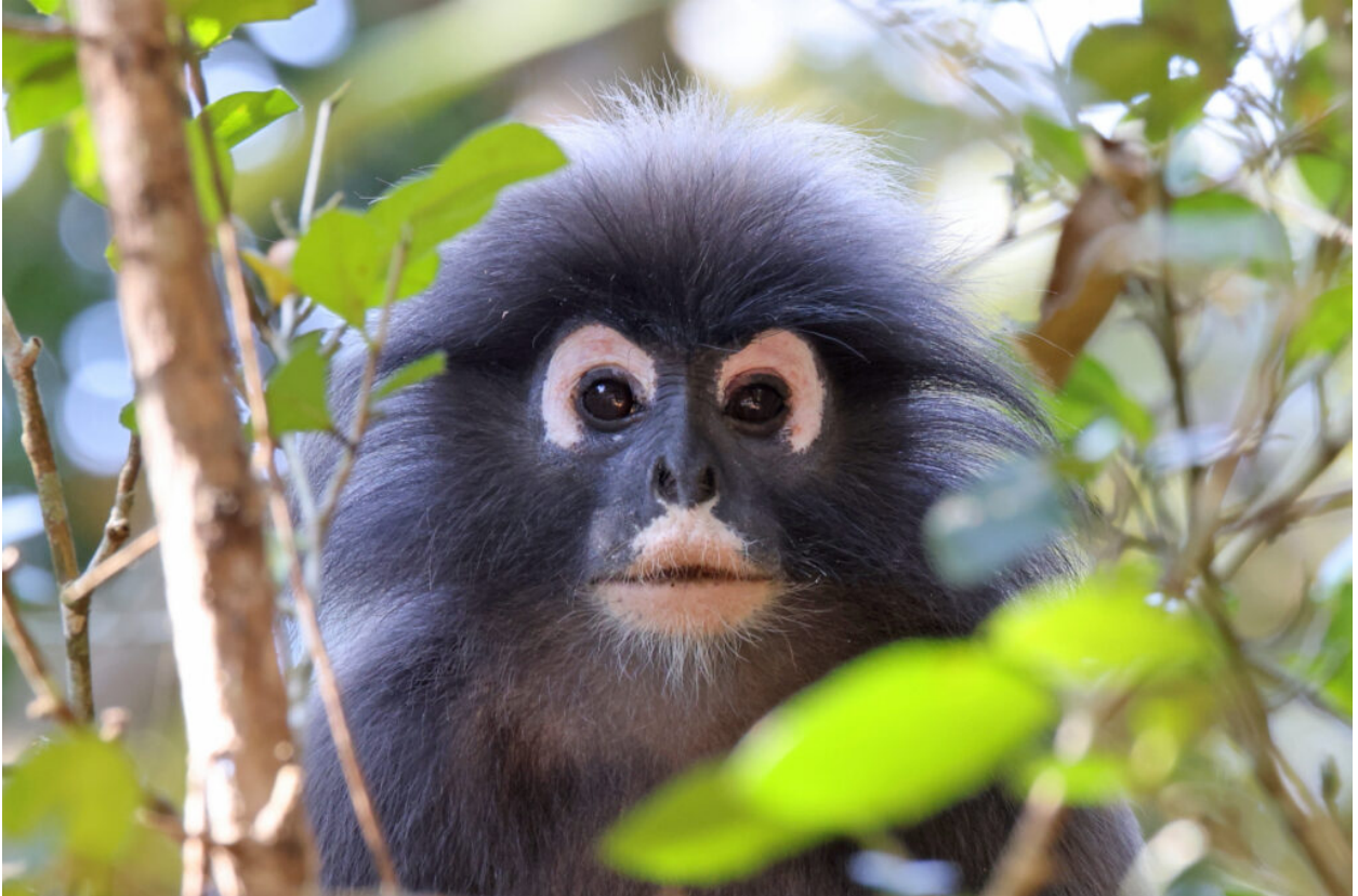
Dusky Langur