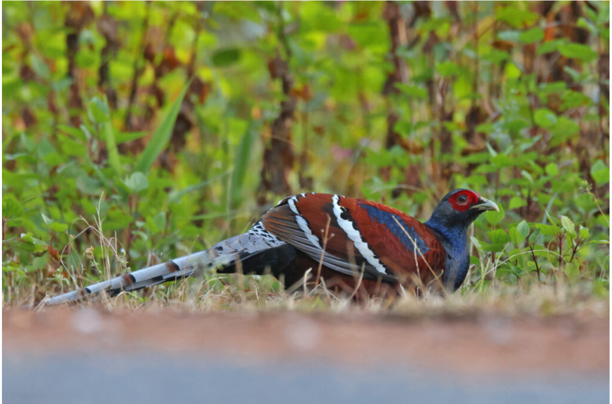
male Mrs Hume's Pheasant