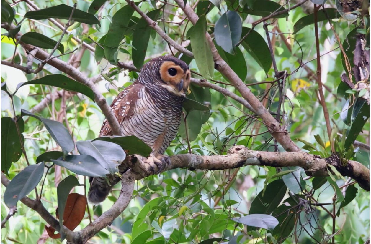
Spotted Wood Owl