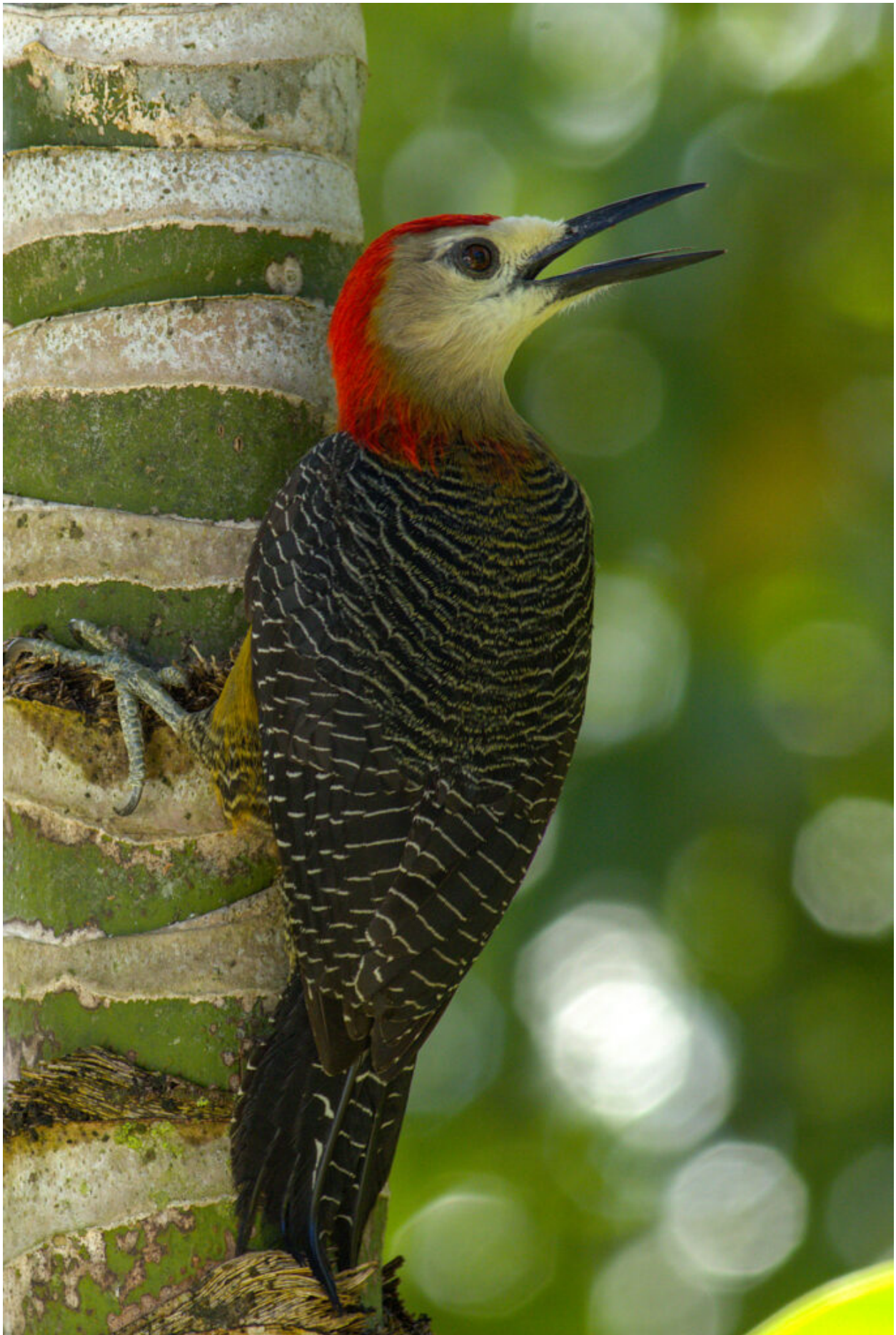
Jamaica Woodpecker