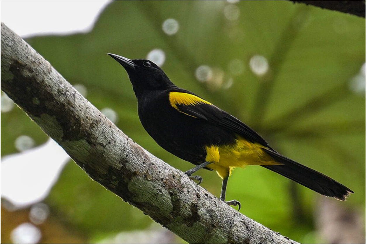
Puerto Rican Oriole