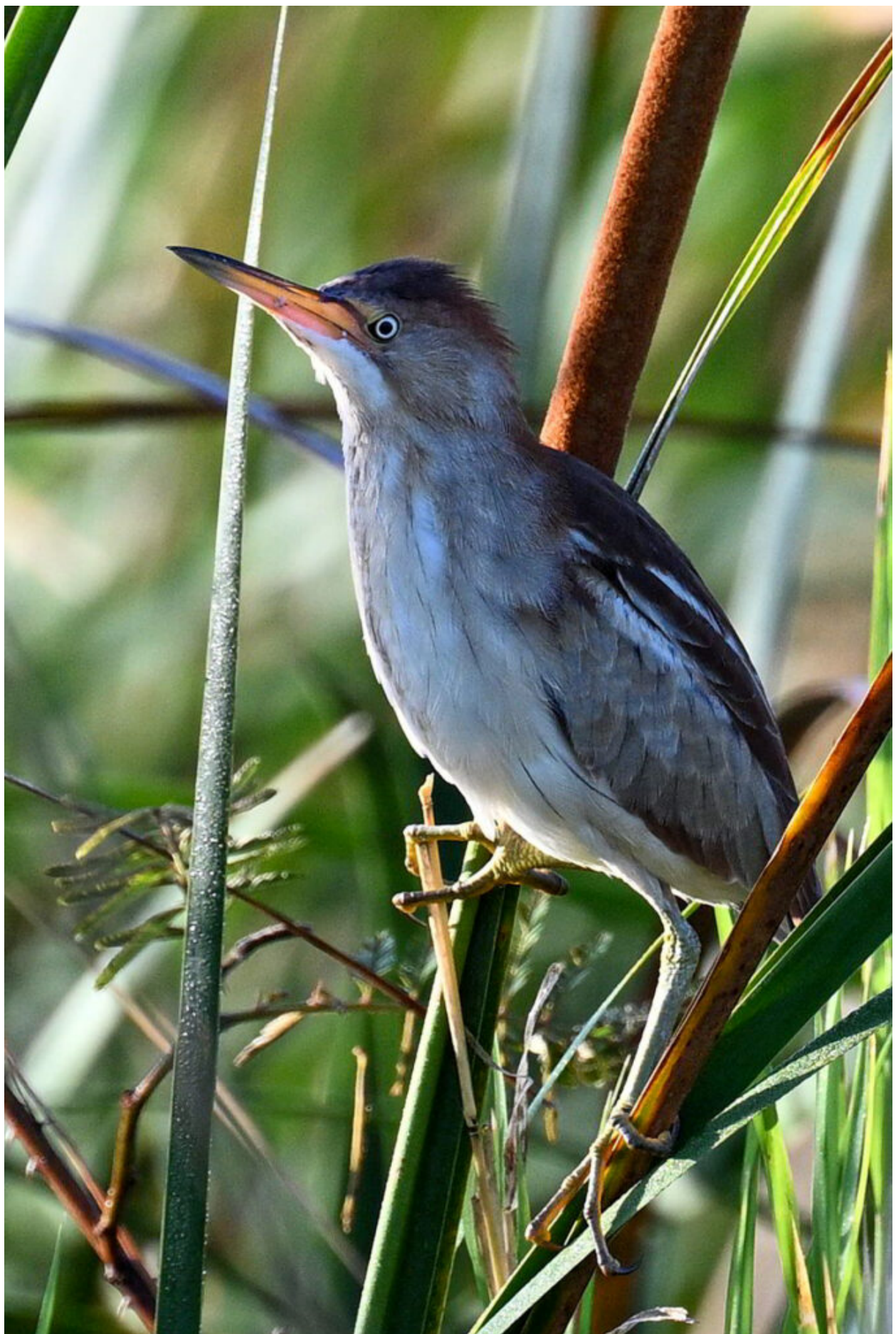
Least Bittern (image by Paul)