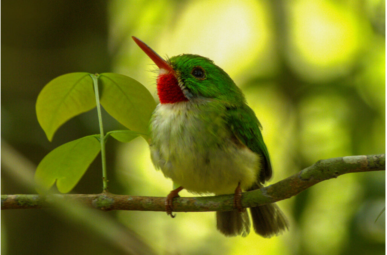
Jamaican Tody