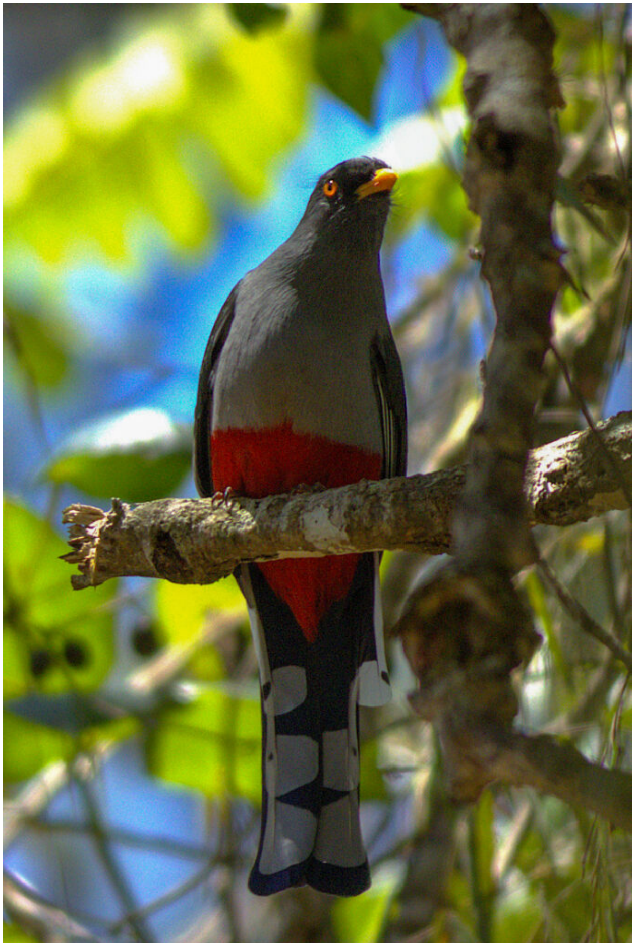
Hispaniolan Trogon (image by Eustace Barnes)