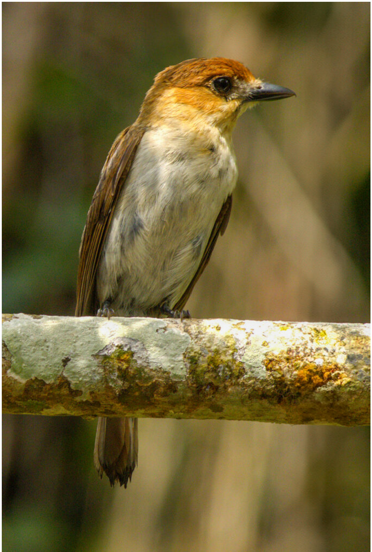
Jamaican Becard