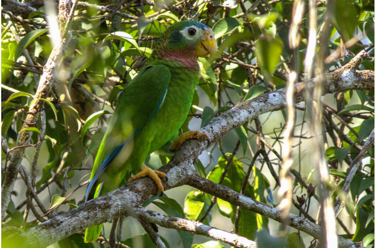
Yellow-billed Amazon