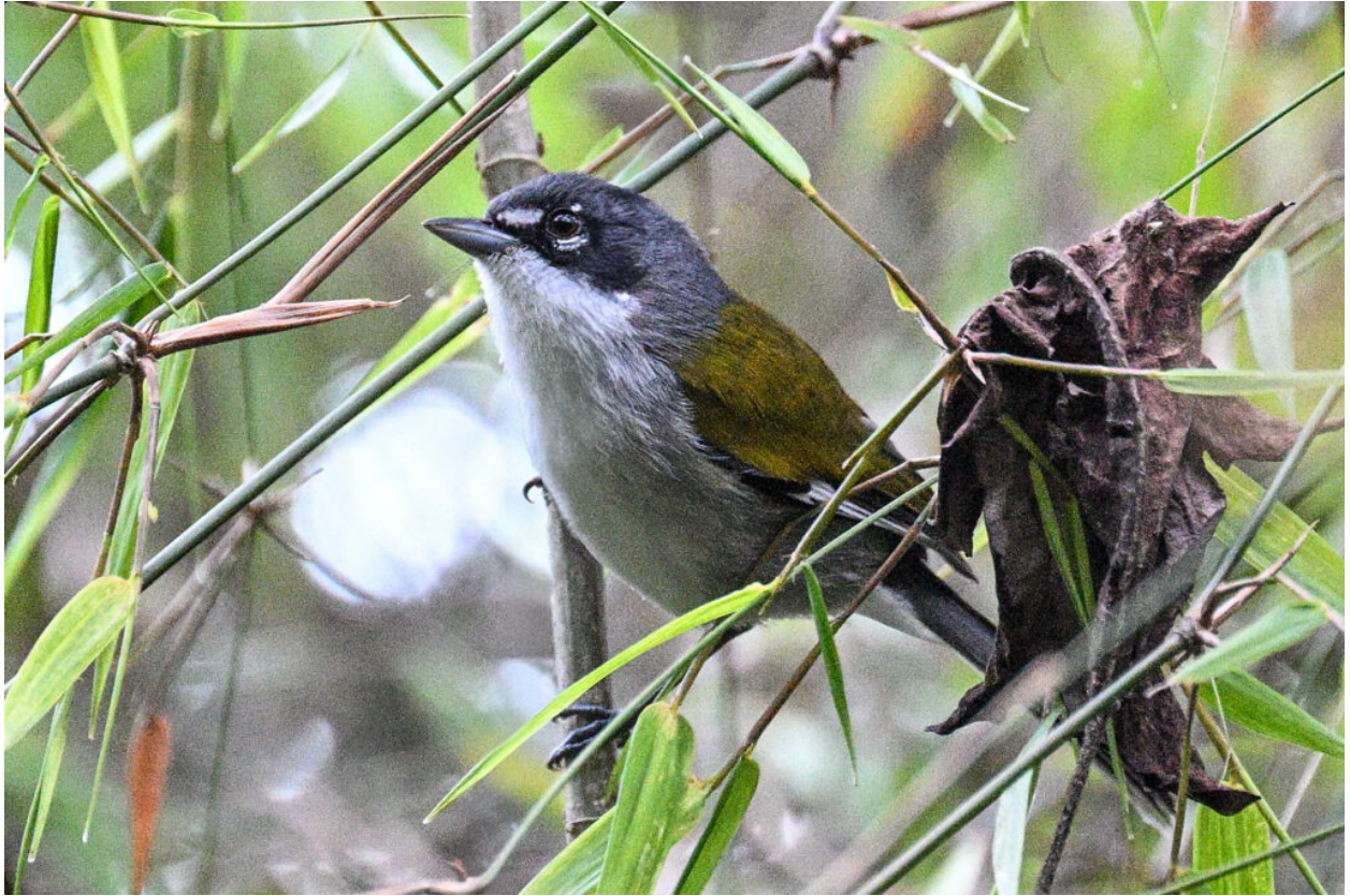
White-winged Warbler