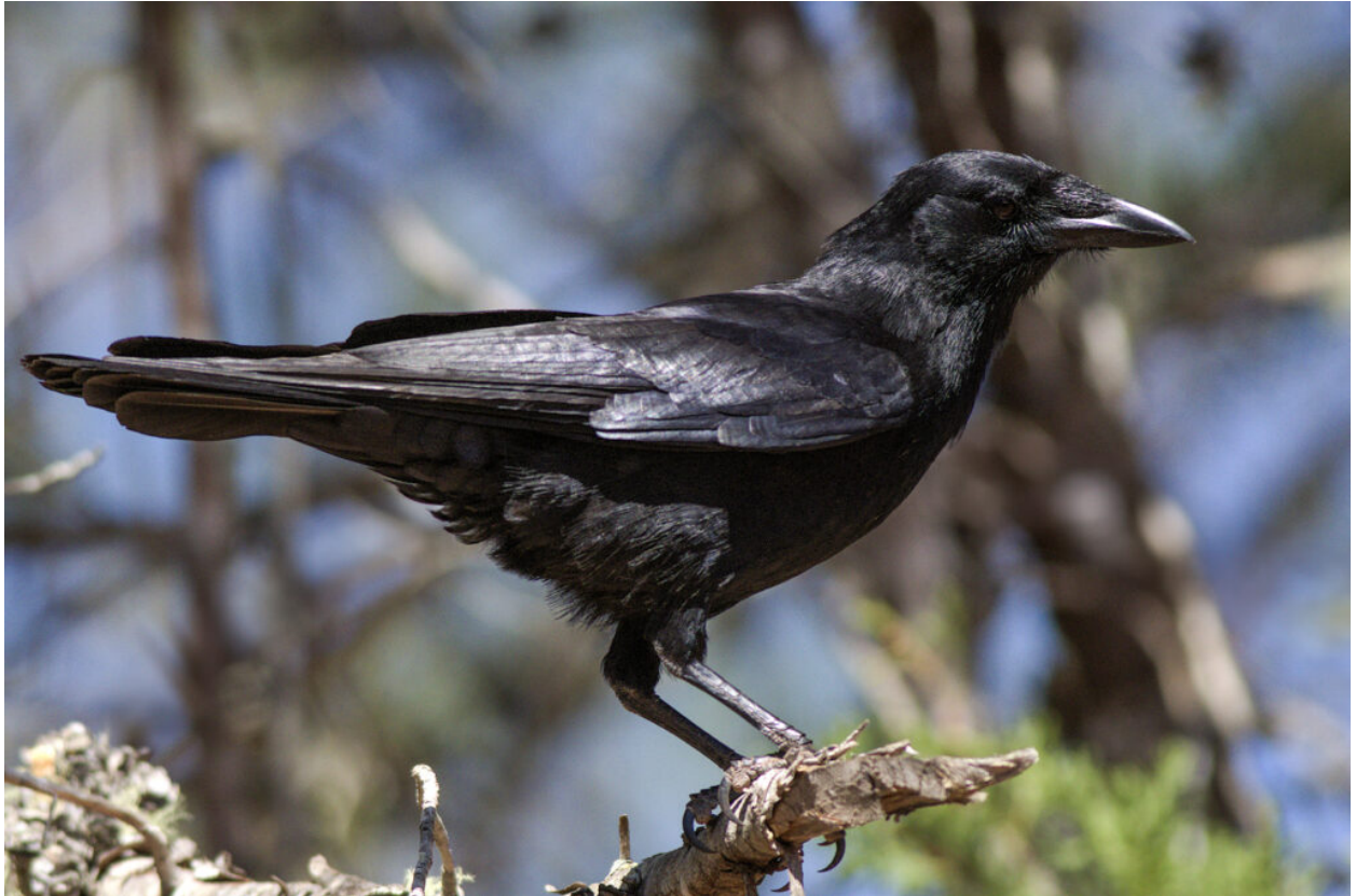
Hispaniolan Palm Crow