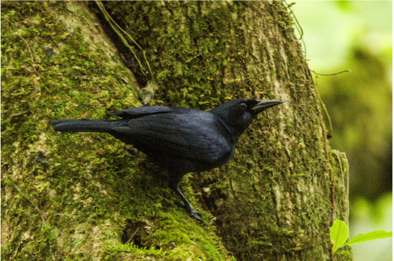
Jamaican Blackbird