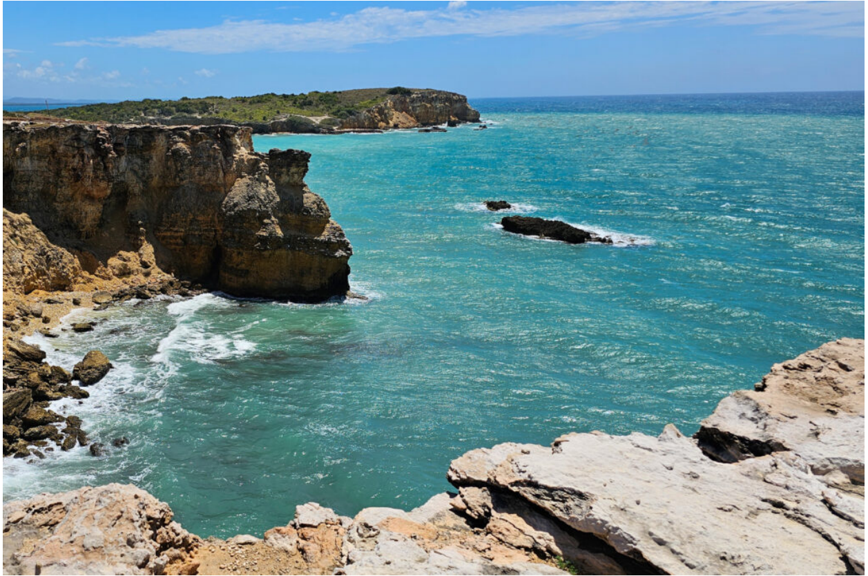
Cabo Rojo