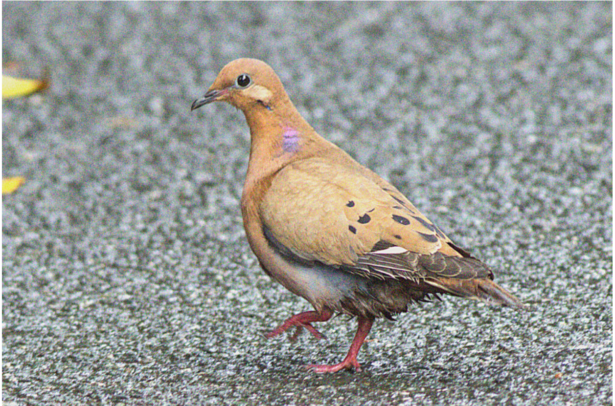
Zenaida Dove (image by Eustace Barnes)