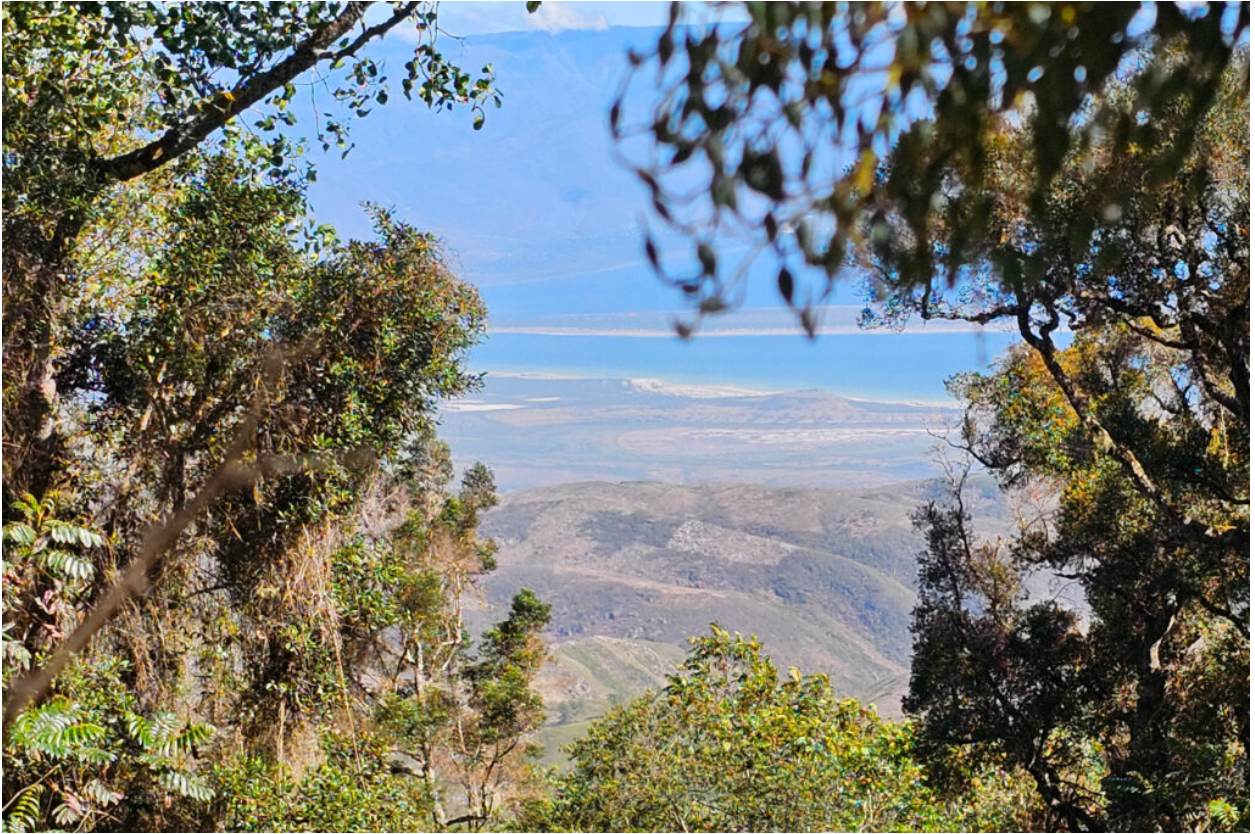
Looking over Lago Enriquillo to Haiti