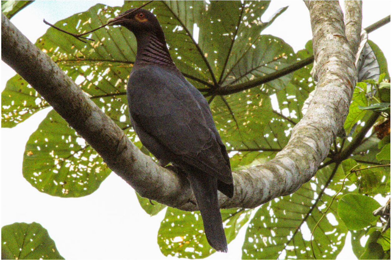
Scaly-naped Pigeon