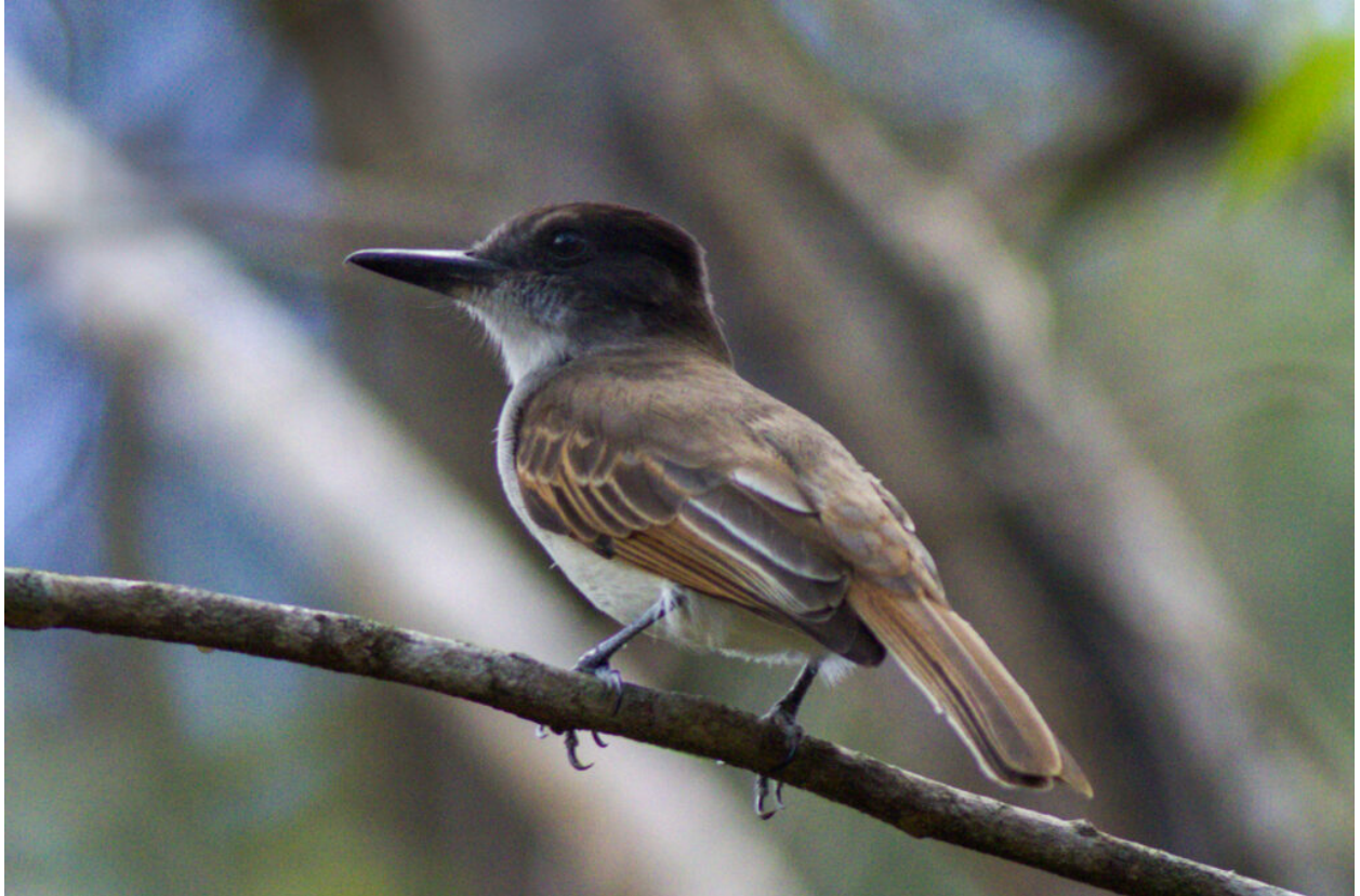
Hispaniolan Loggerhead