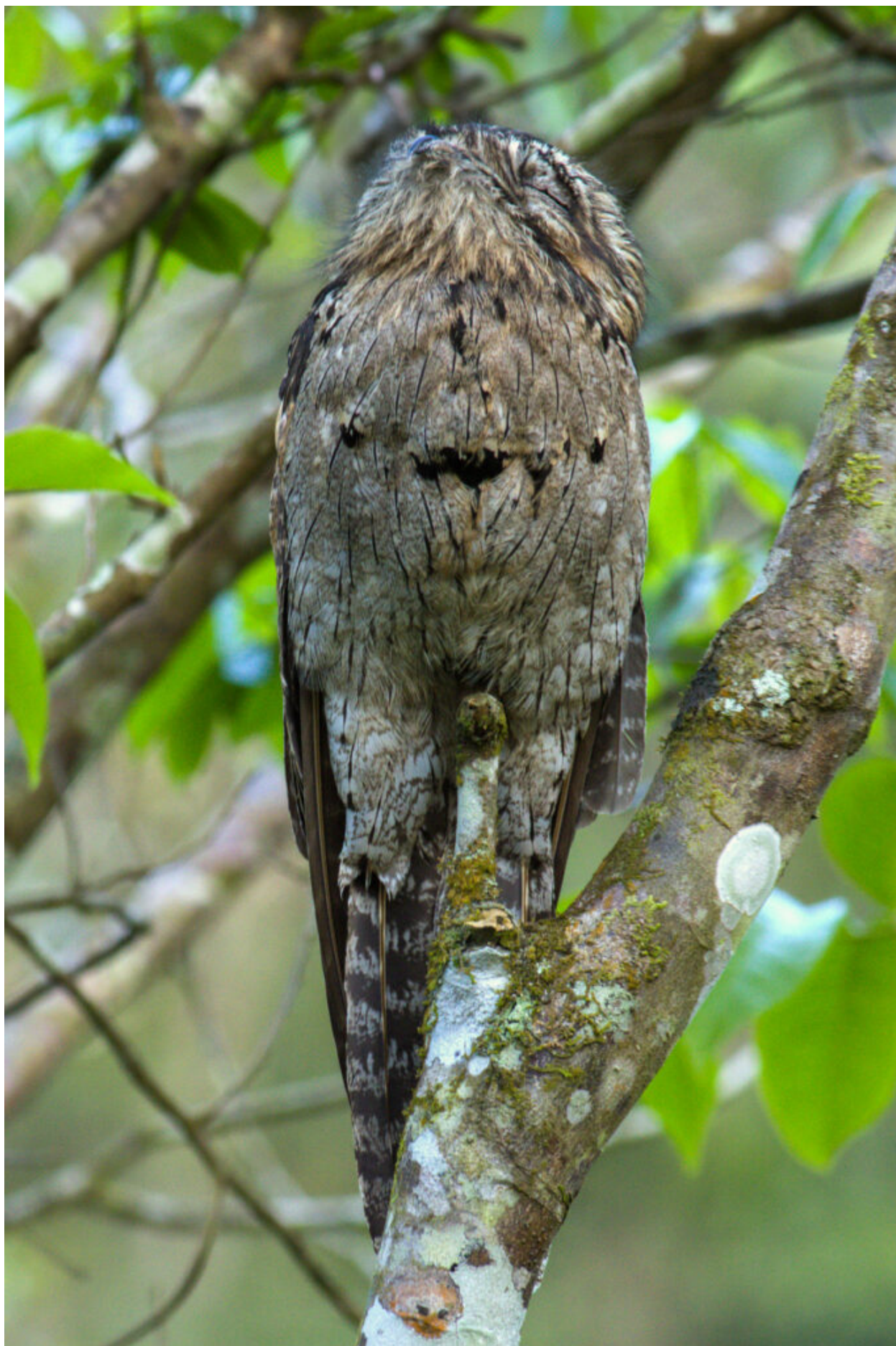
Northern Potoo