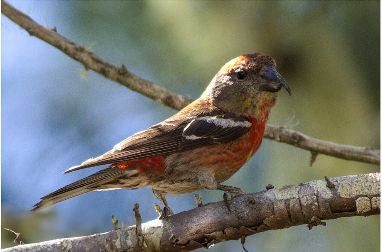
Hispaniolan Crossbill