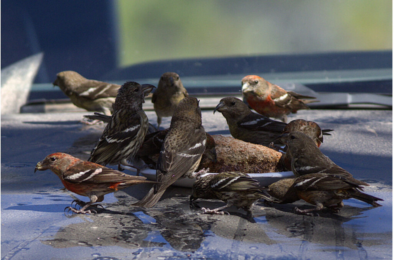
Hispaniolan Crossbill