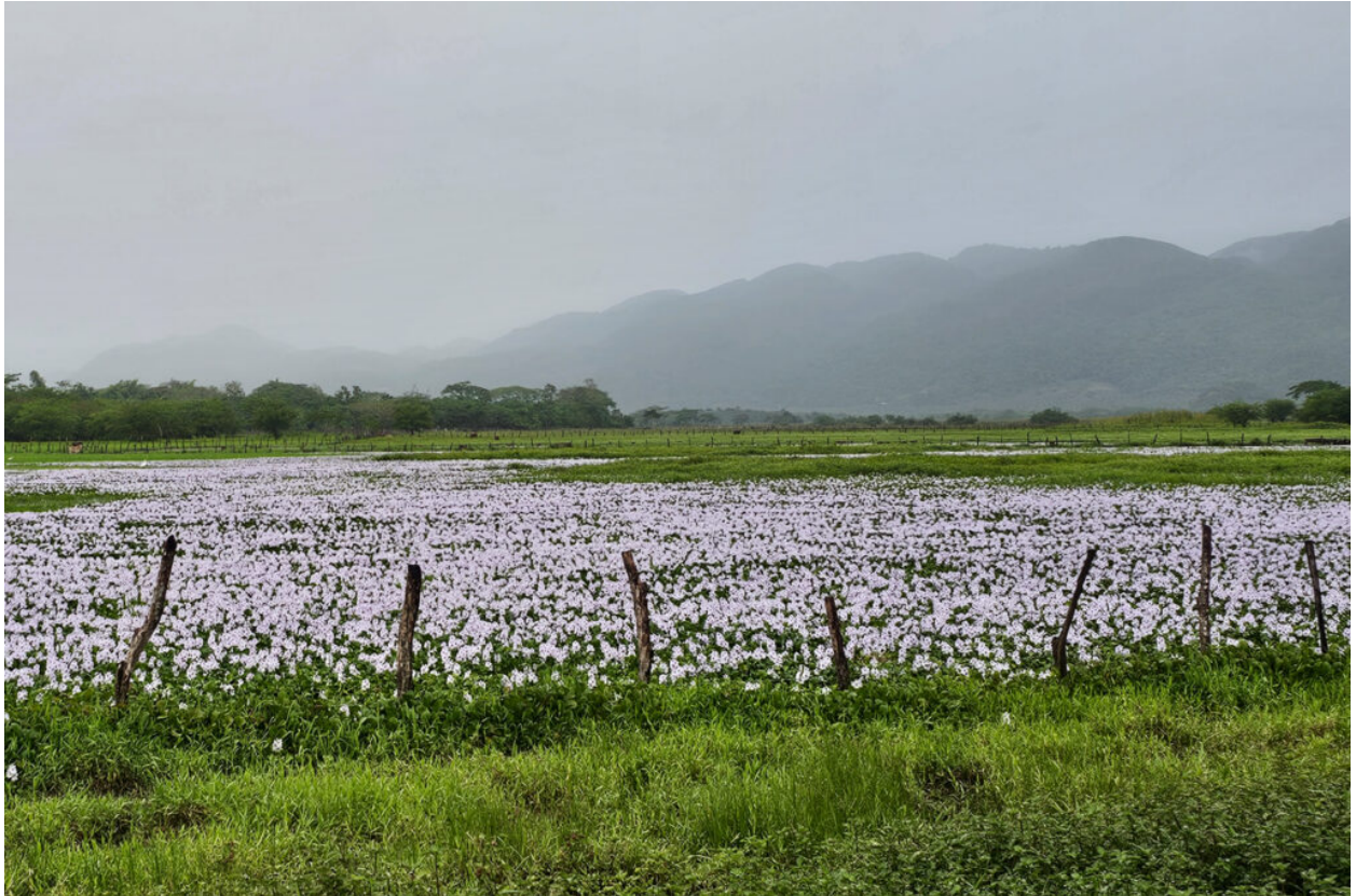
Black Morass Wetlands (image by Eustace Barnes)