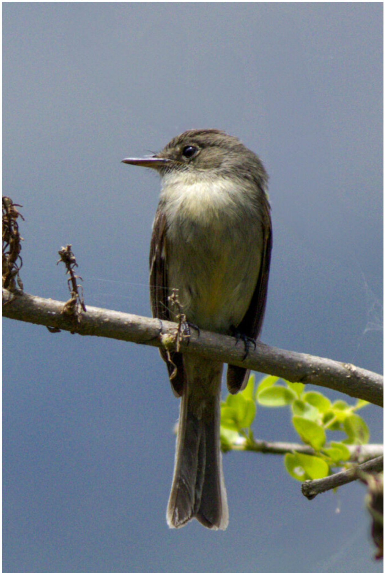
Hispaniolan Pewee