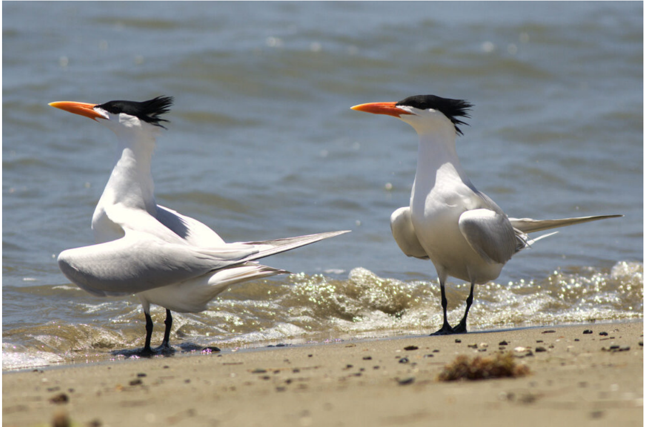
American Royal Tern