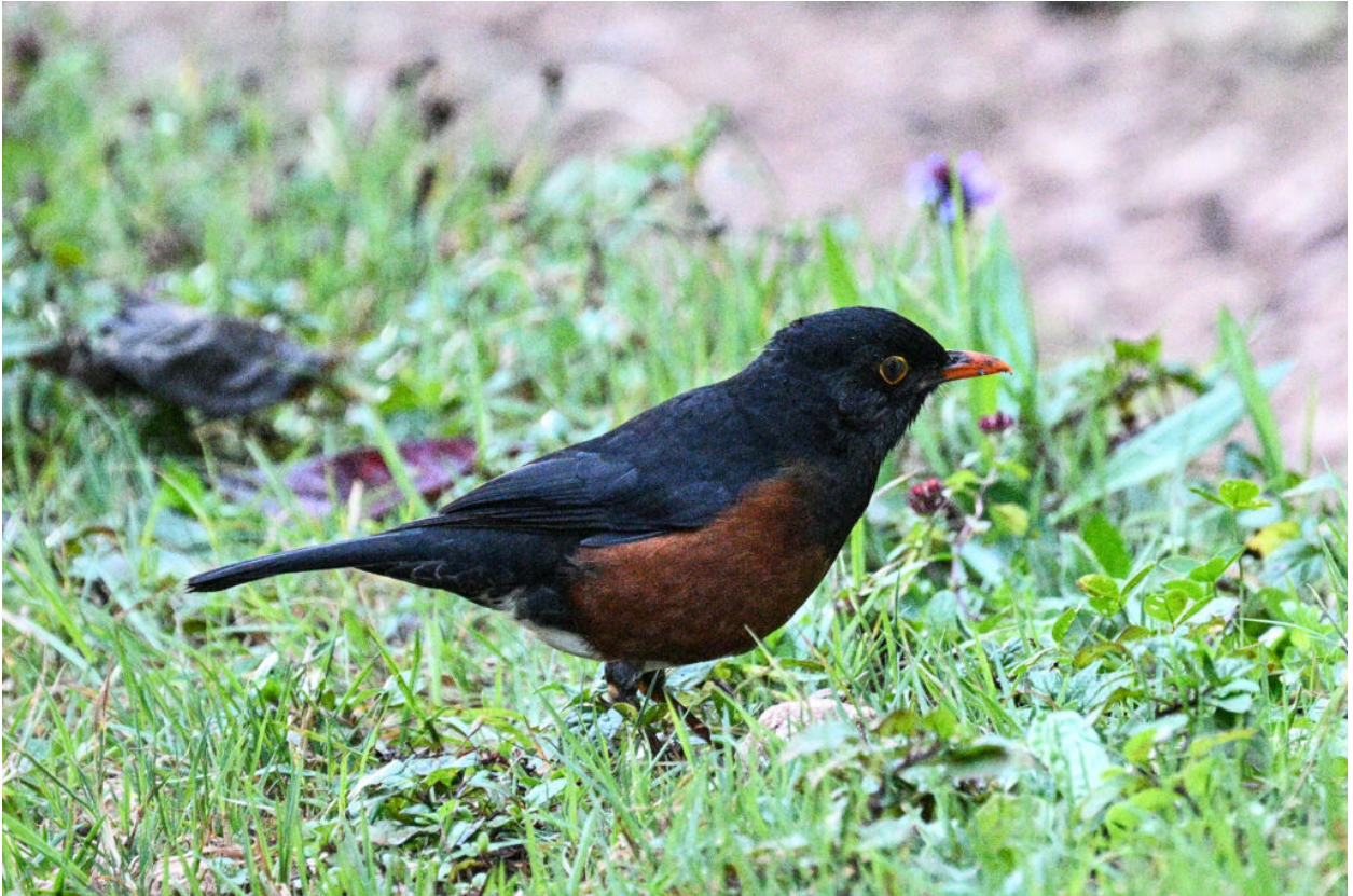
La Selle Thrush