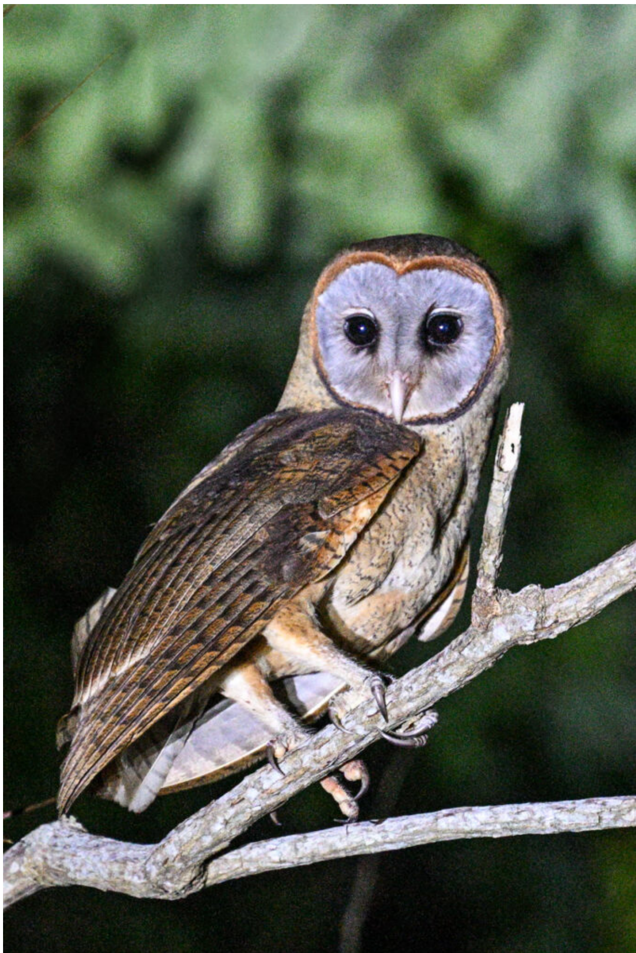
Ashy-faced Owl