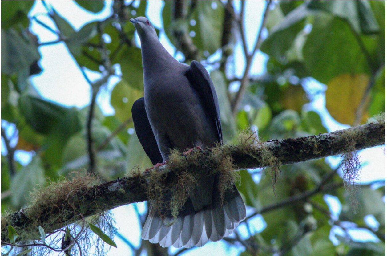
Ring-tailed Pigeon