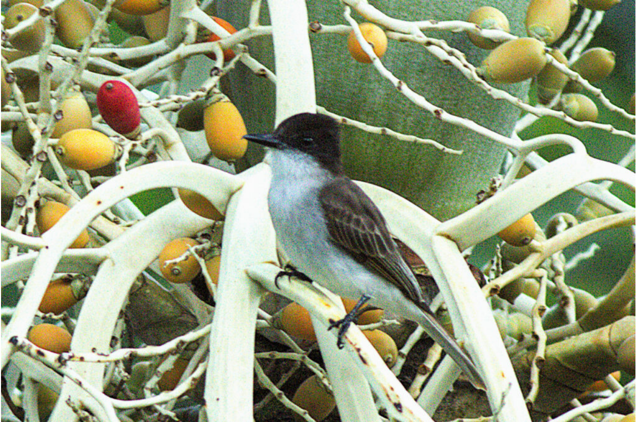
Puerto Rican Loggerhead Kingbird