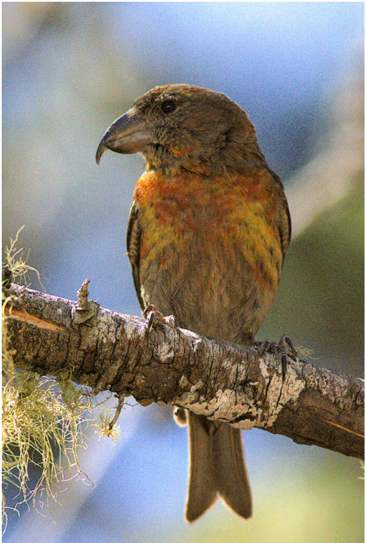
Hispaniolan Crossbill (image by Eustace Barnes)