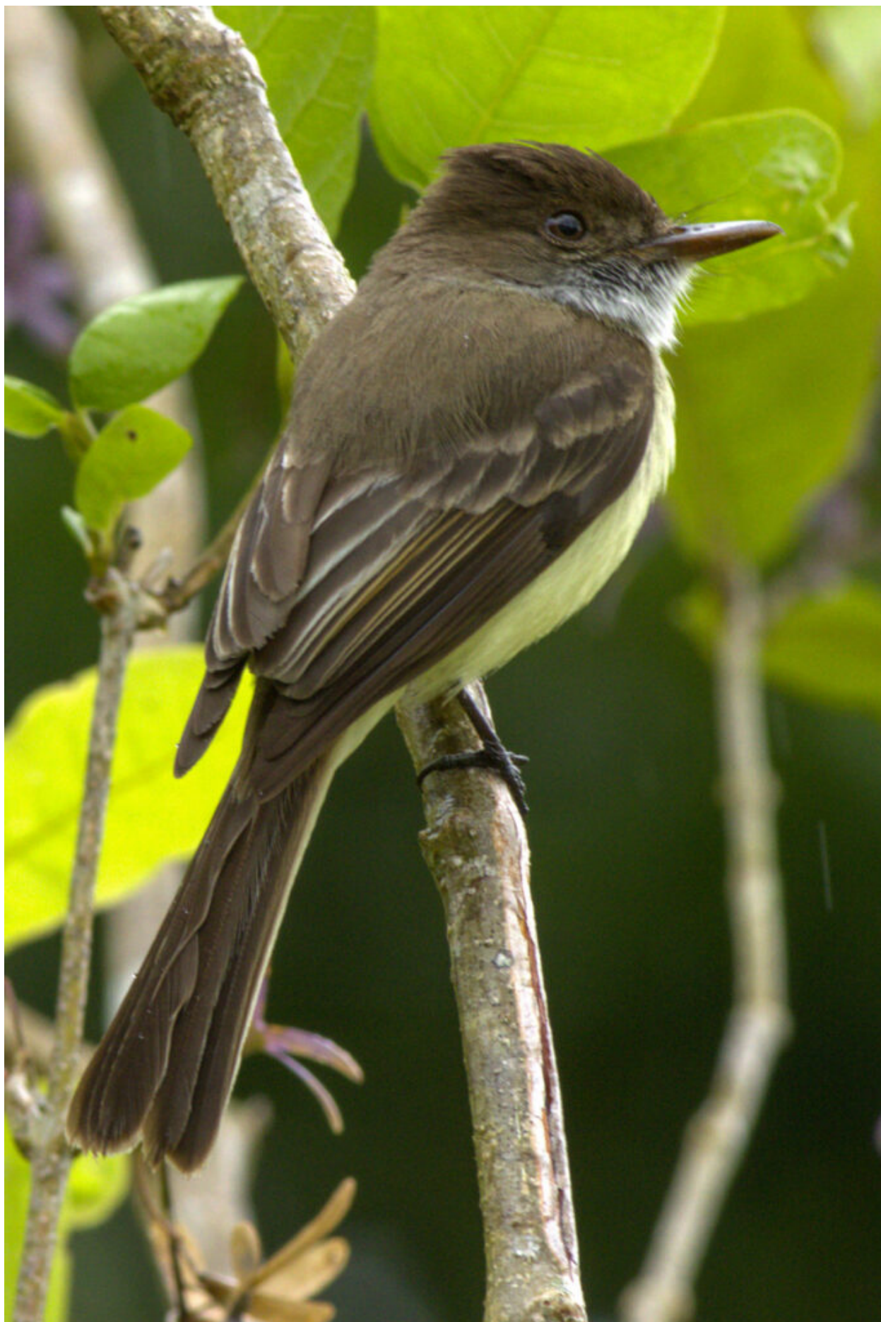
Sad Flycatcher