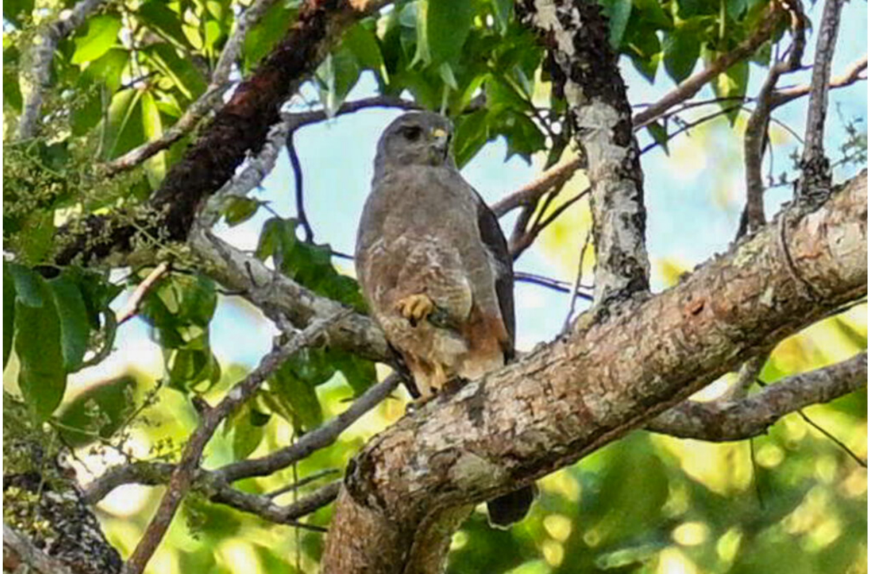
Ridgway's Hawk