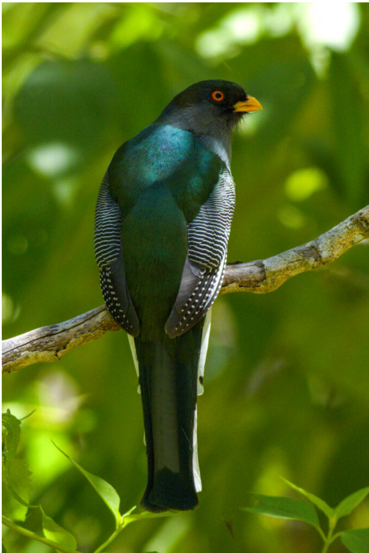
Hispaniolan Trogon