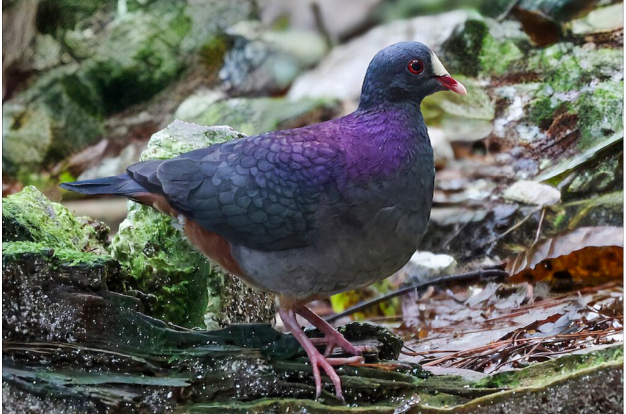
White-fronted Quail Dove