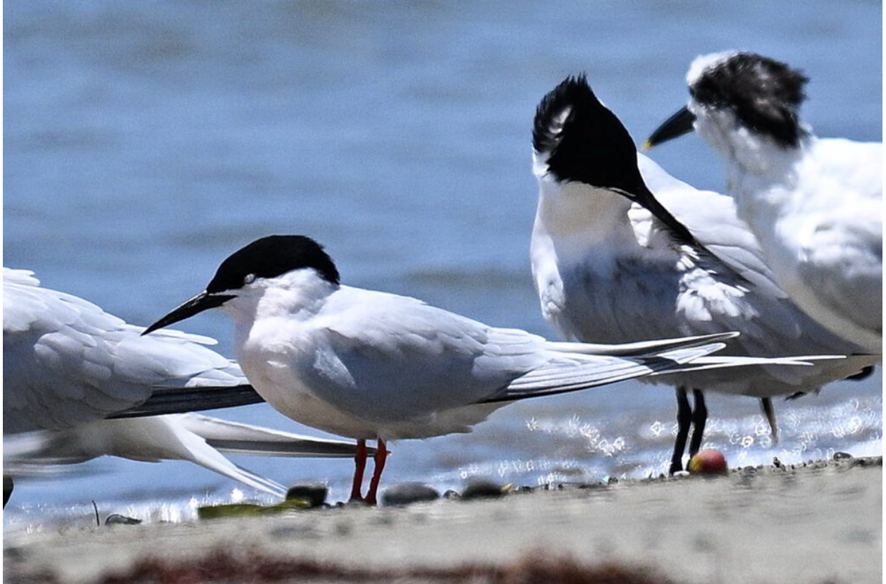
Roseate Tern