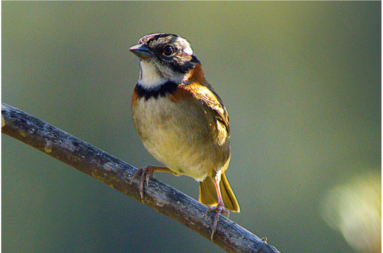
Rufous-collared Sparrow