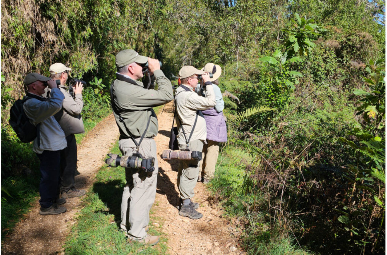
Group in the Sierra Baharucu