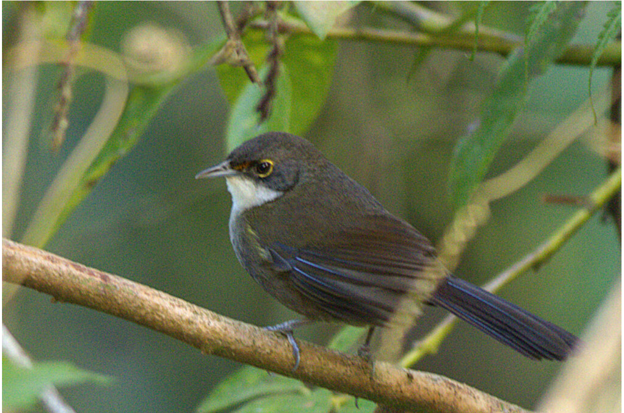
Eastern Chat-Tanager (image by Eustace Barnes)