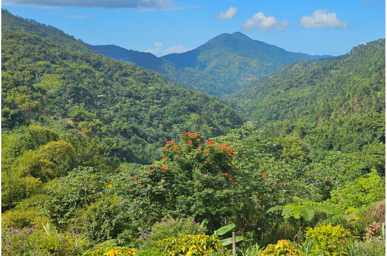
Blue Mountains