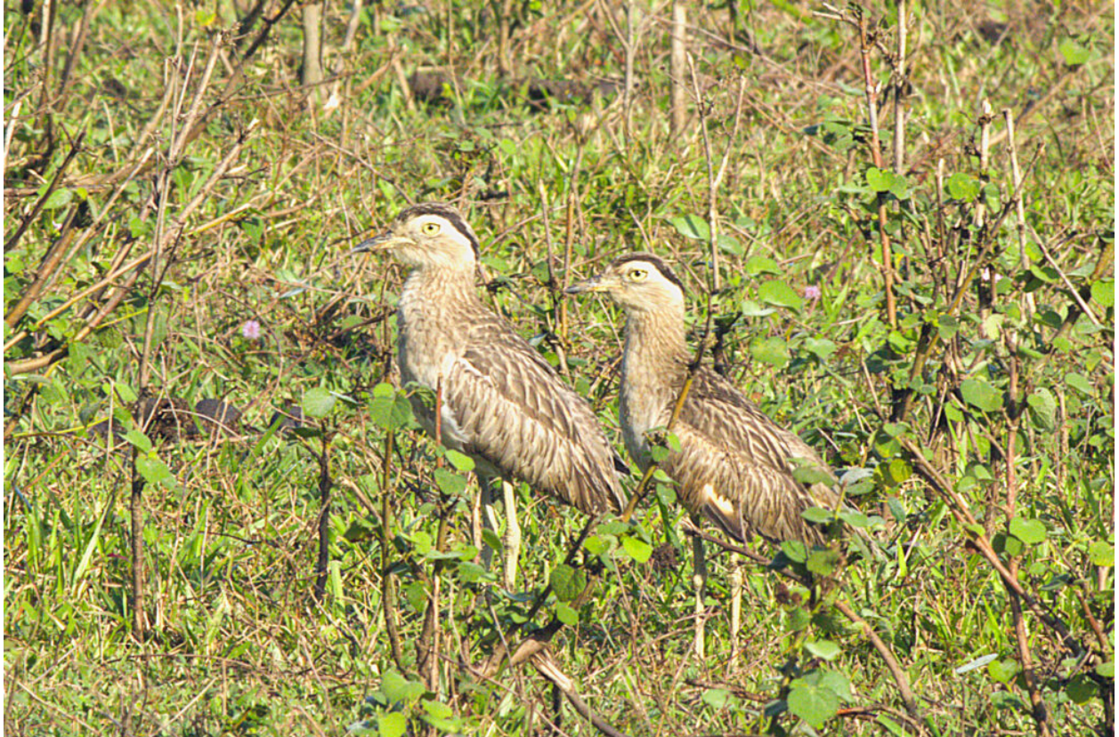
Double-Striped Thick-knee