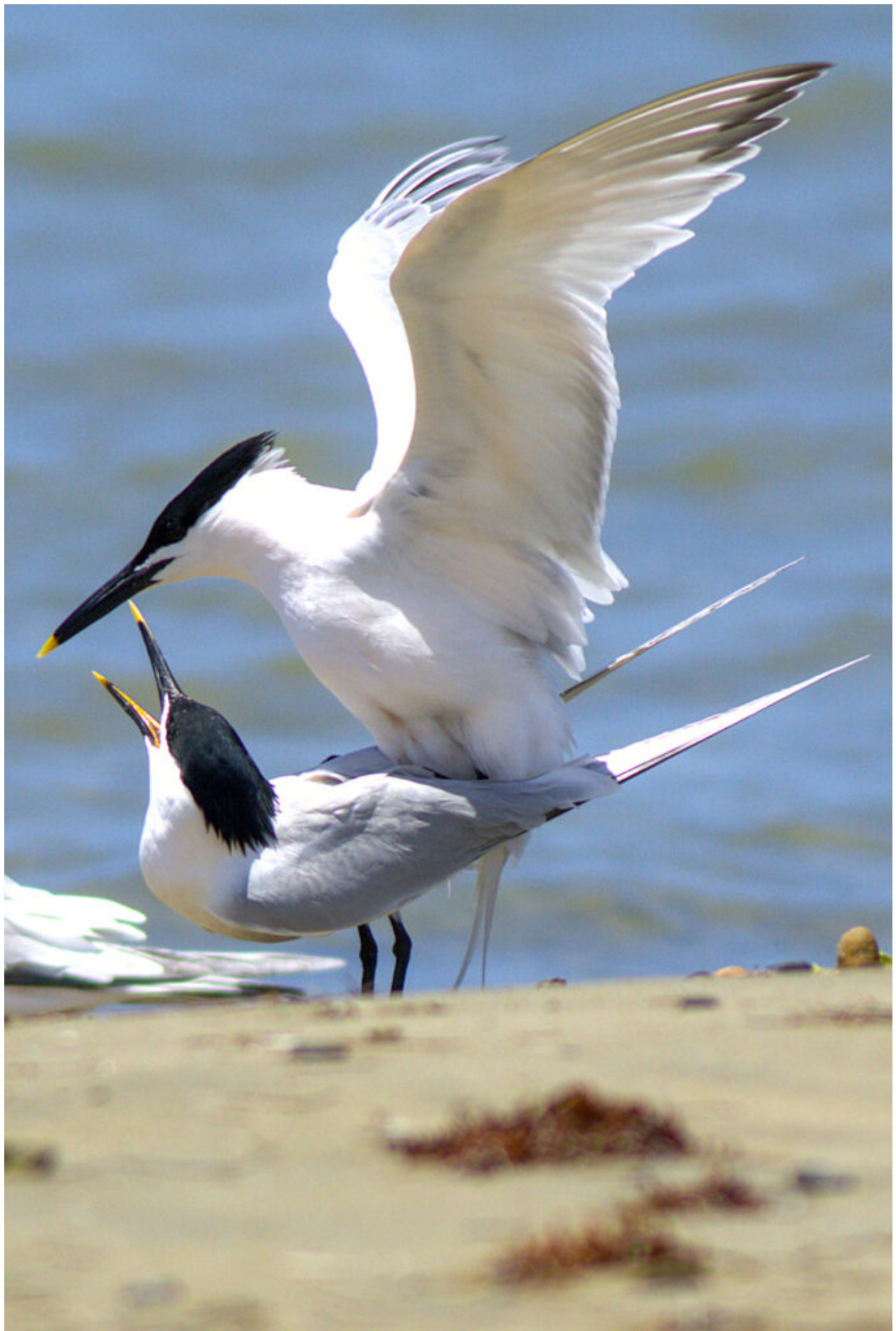
Cabot's Tern