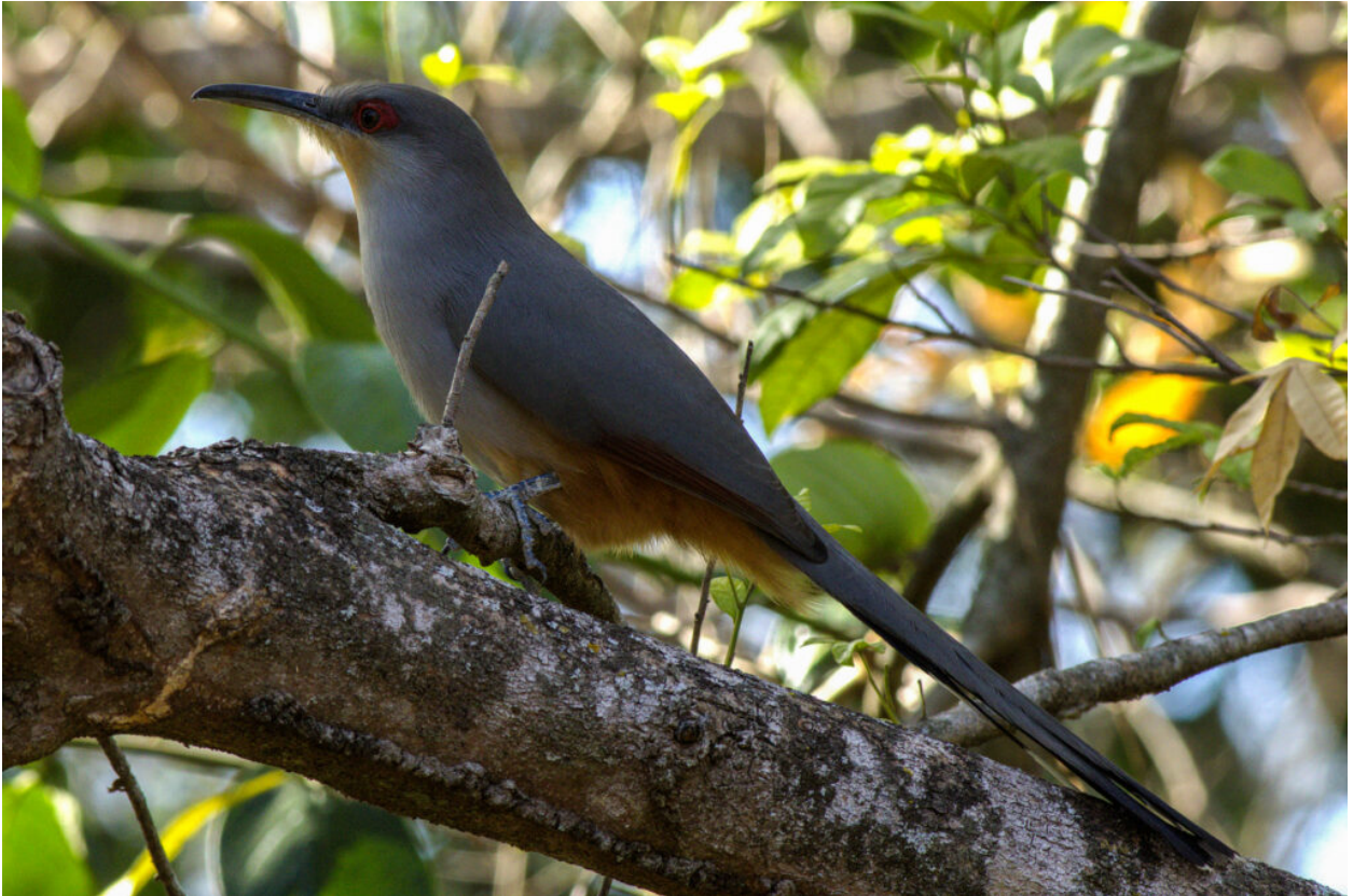
Hispaniolan Lizard-cuckoo