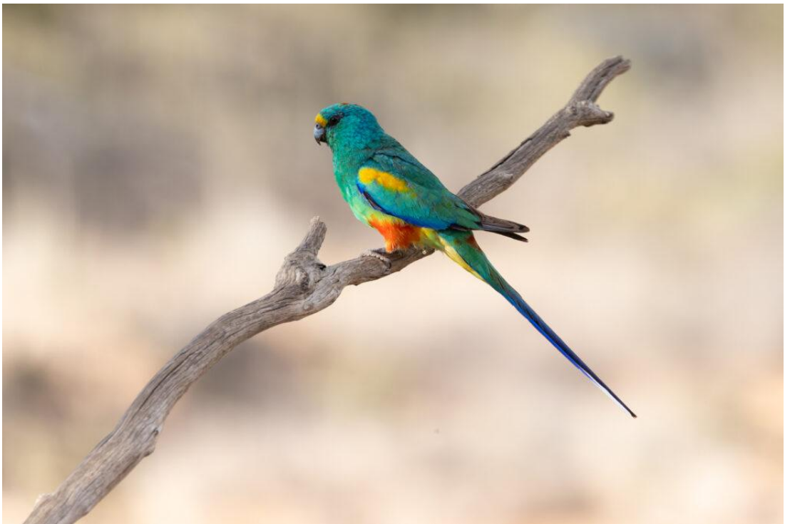
Mulga Parrot