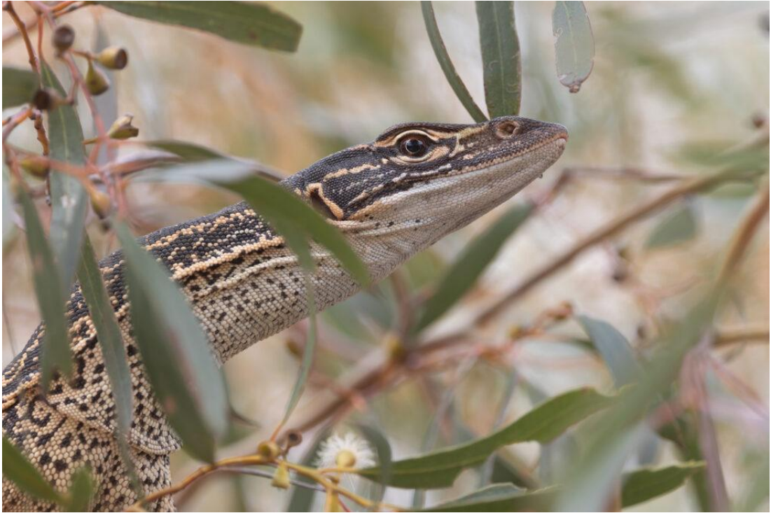
Sand Goanna