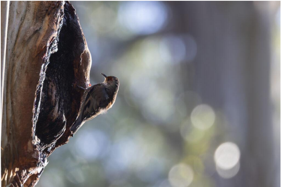
Red-browed Treecreeper