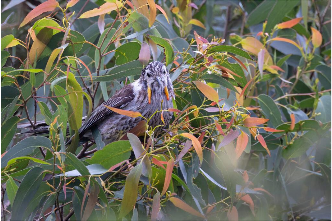
Yellow Wattlebird