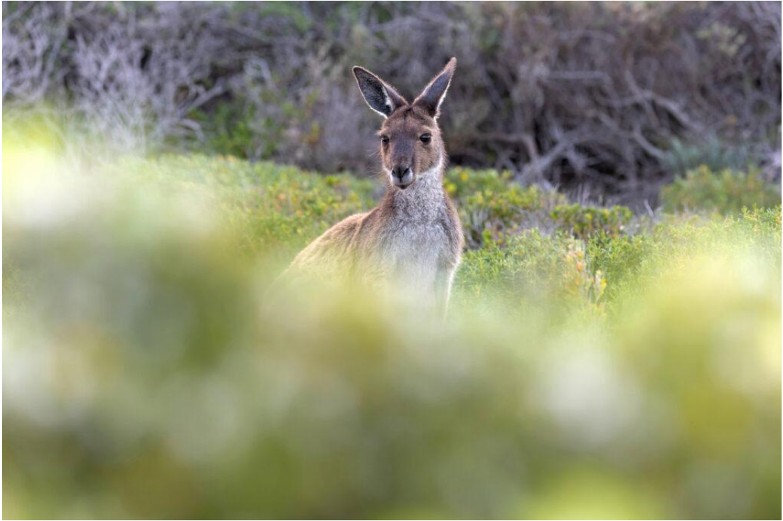
Western Grey Kangaroo