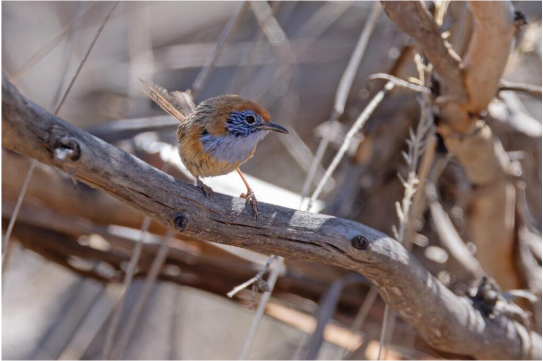
Mallee Emu-wren