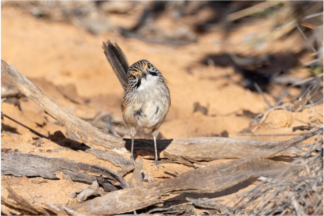
Striated Grasswren