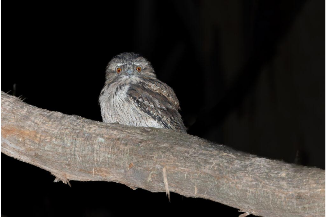
Tawny Frogmouth