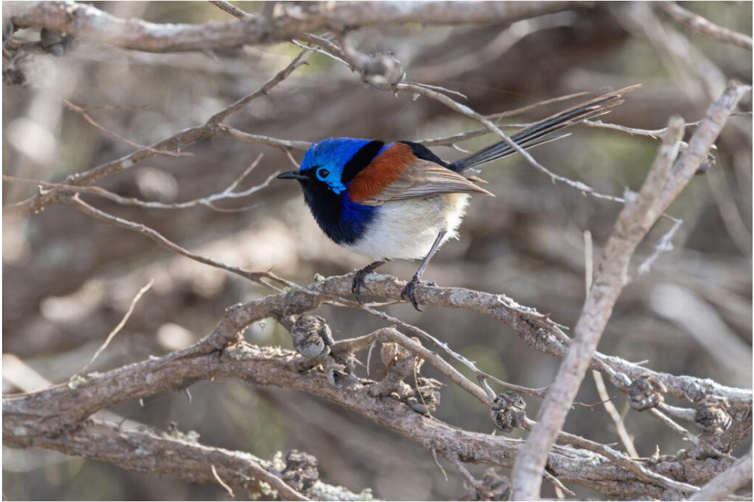
Purple-backed Fairywren