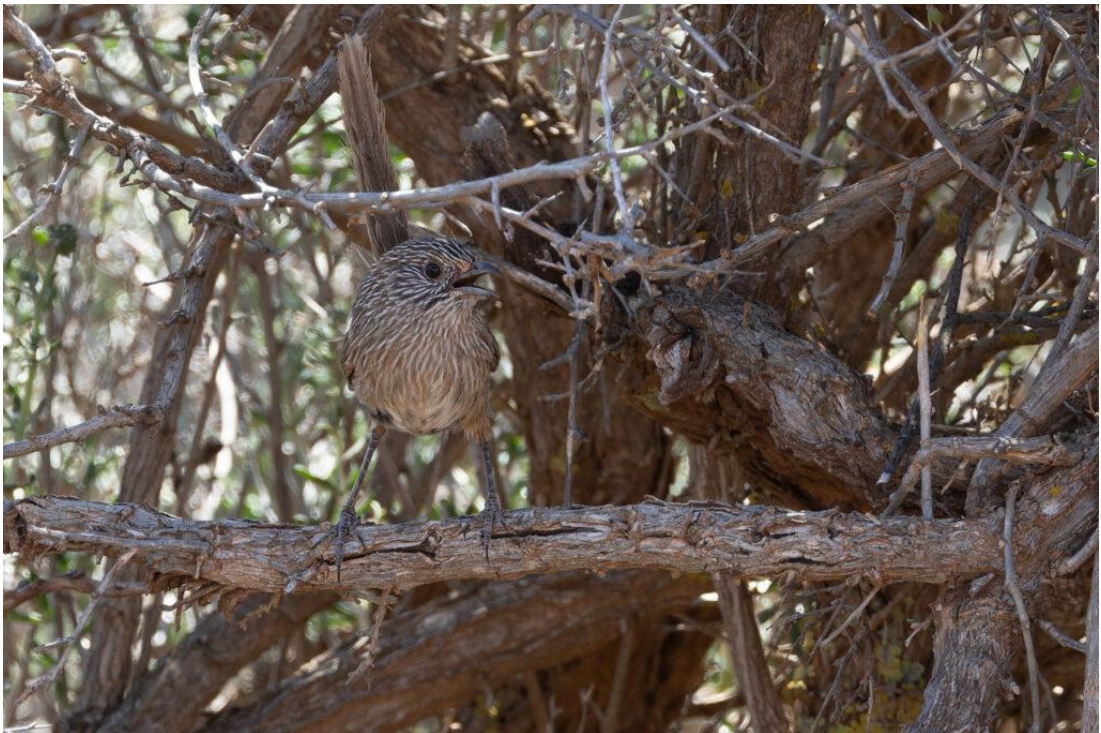
Western Grasswren