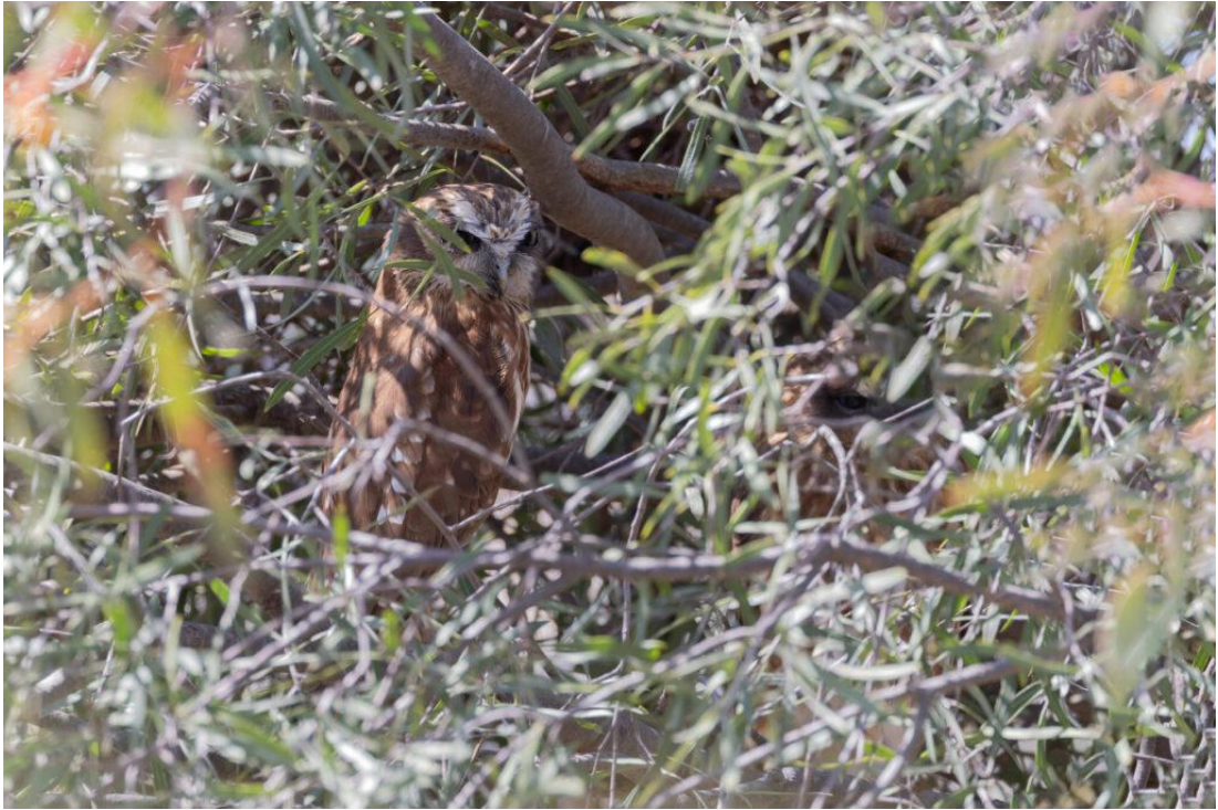
Australian Boobook