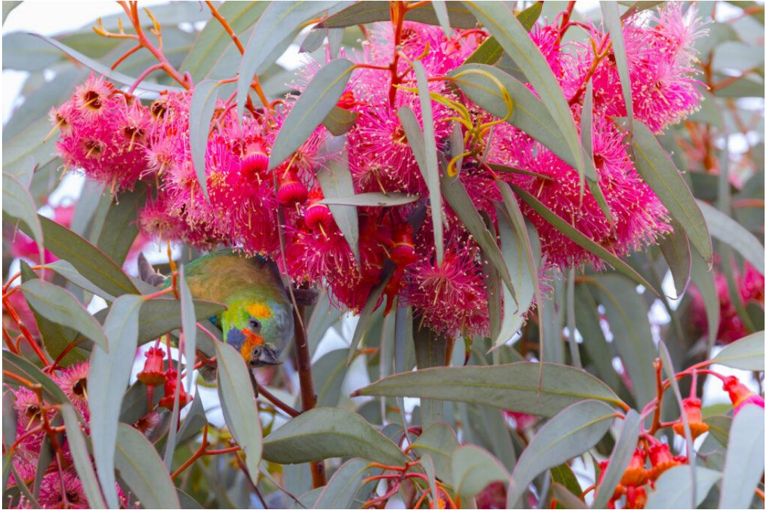
Purple-crowned Lorikeet