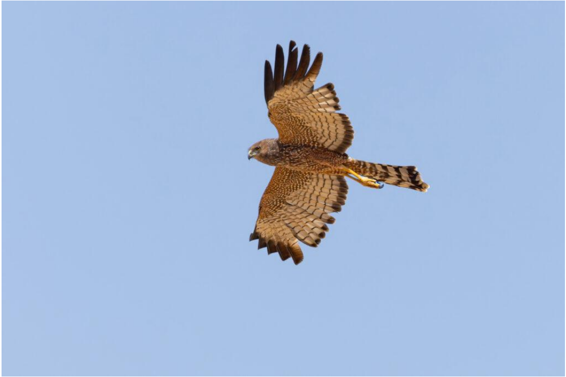
Spotted Harrier