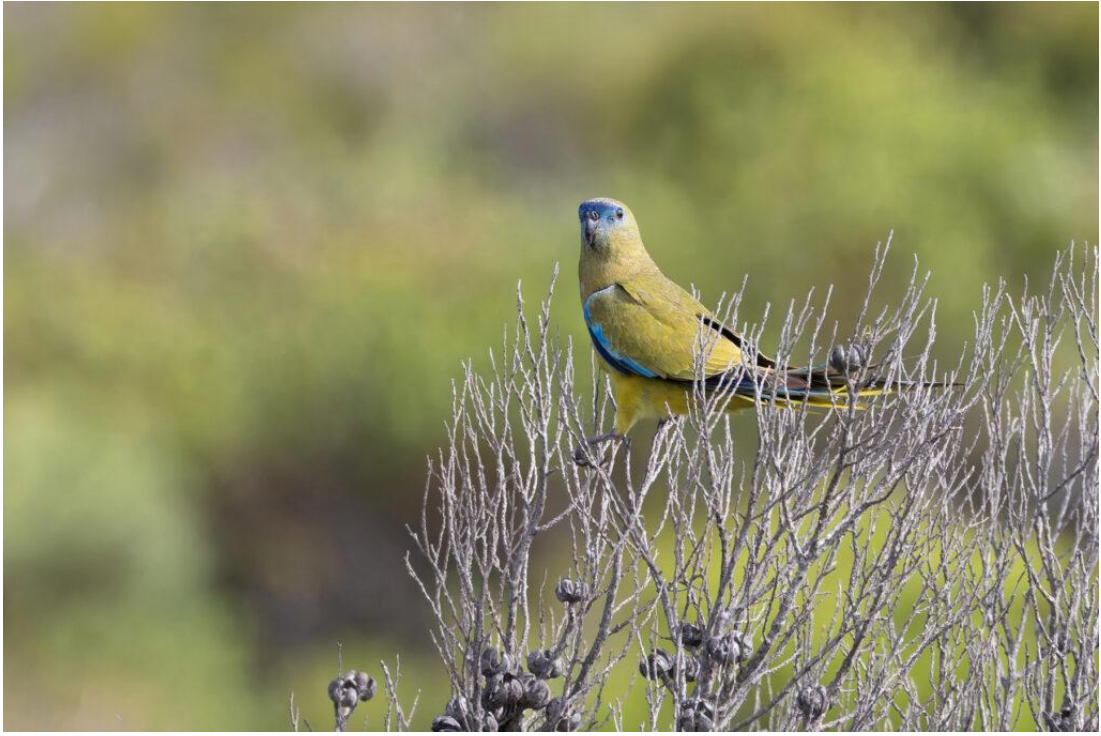
Rock Parrot