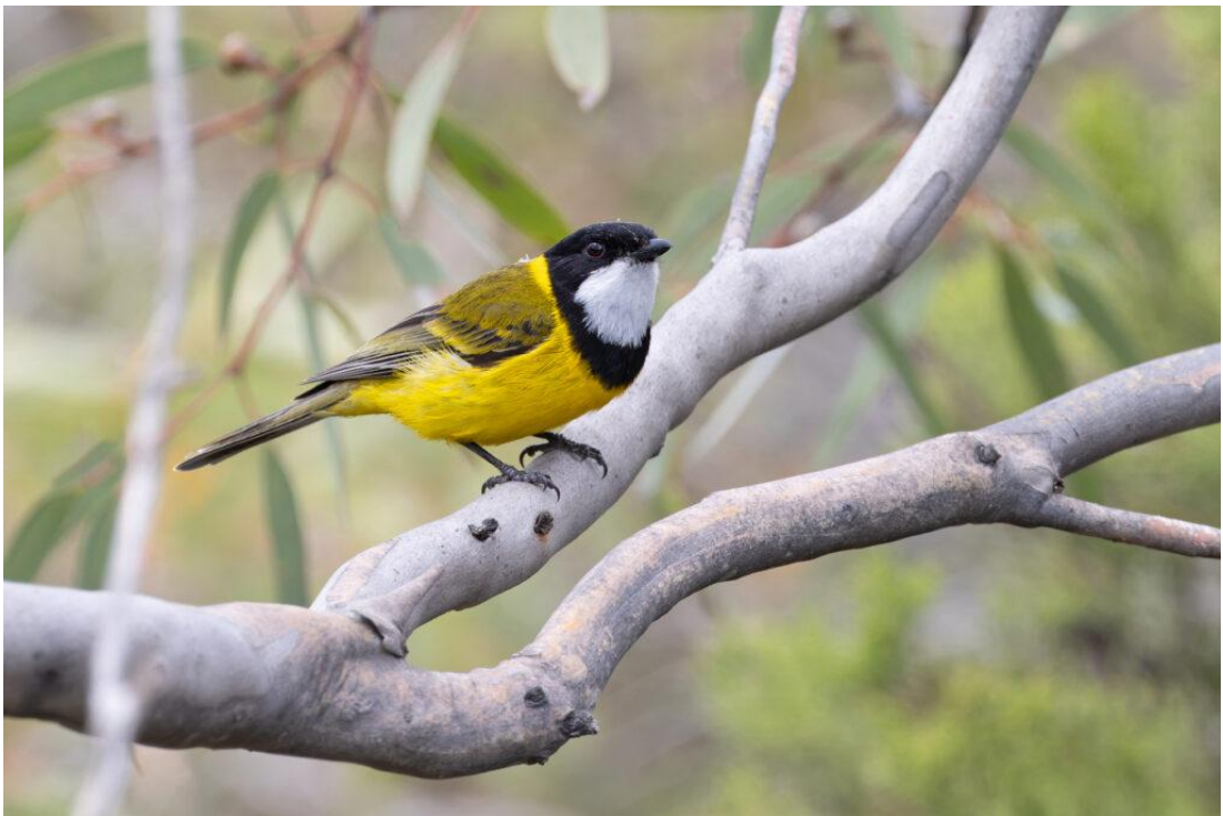
Western Whistler