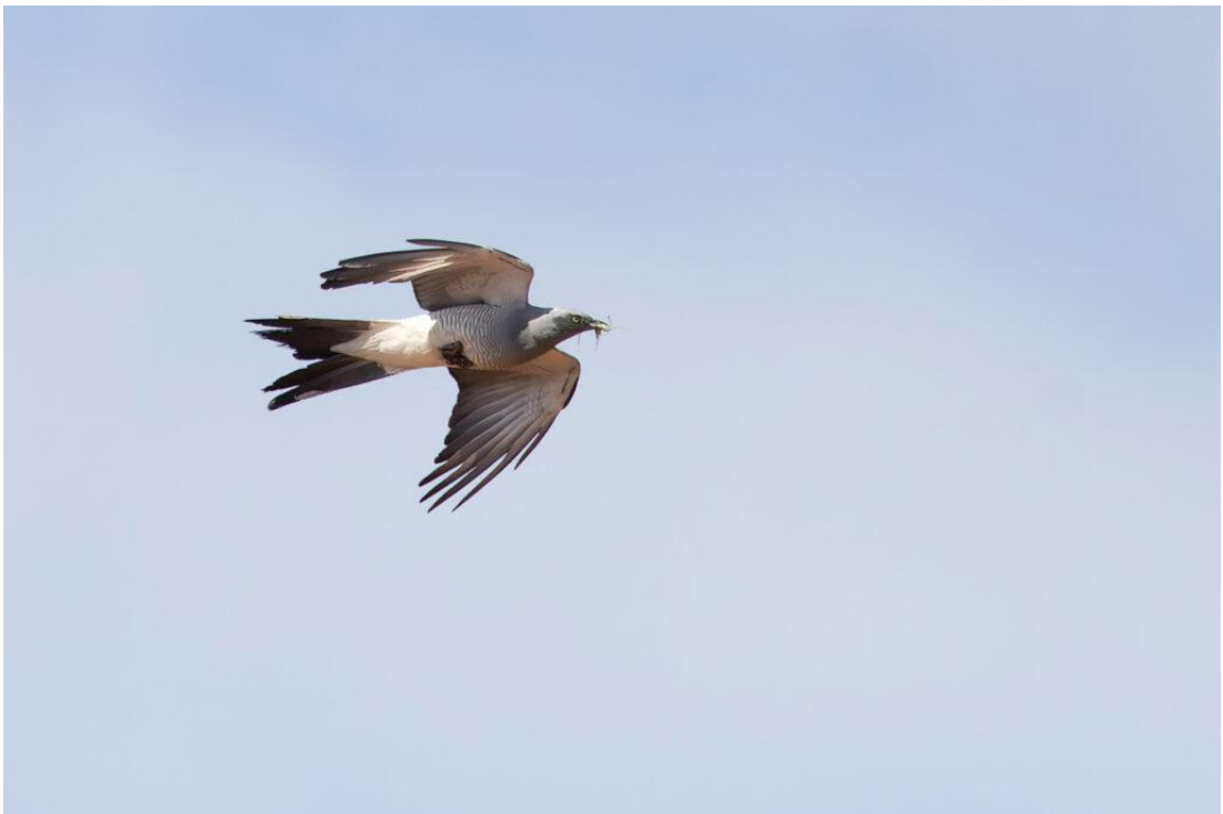
Ground Cuckooshrike