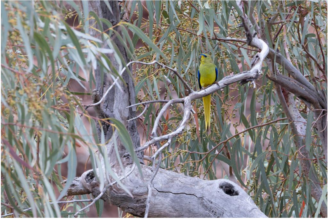
Elegant Parrot