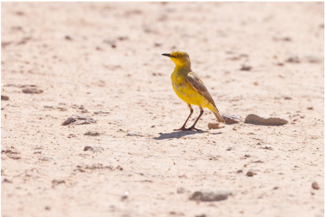
Gibberbird