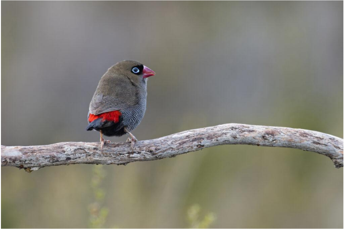
Beautiful Firetail