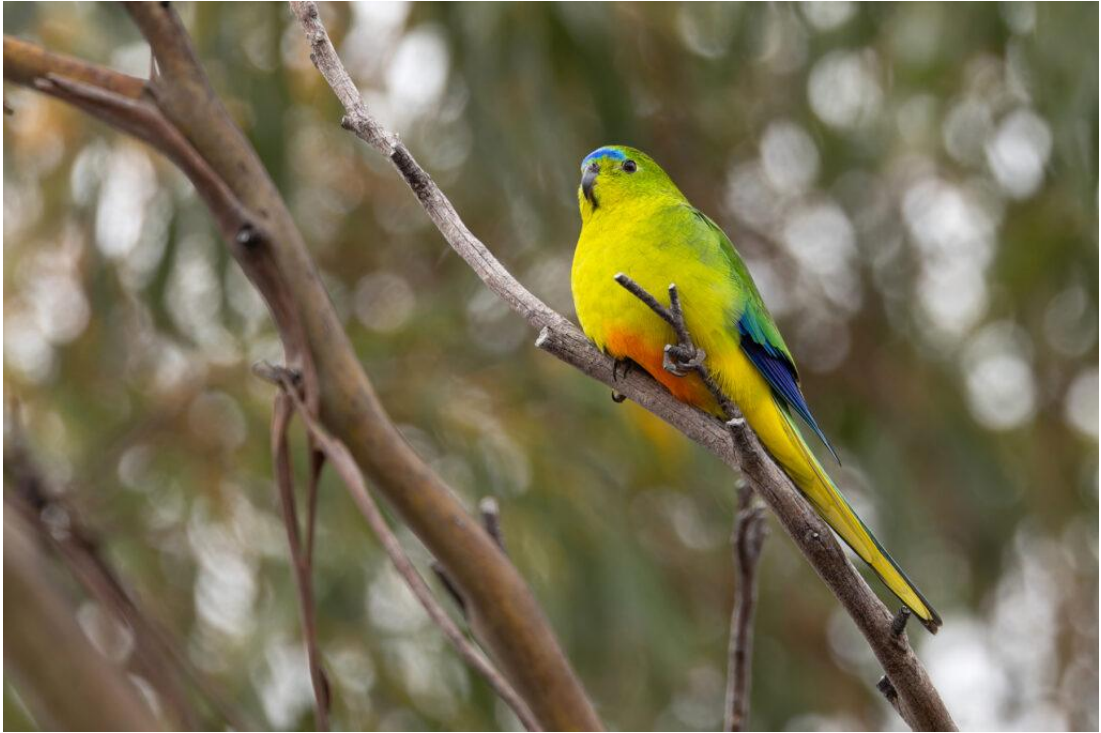
Orange-bellied Parrot