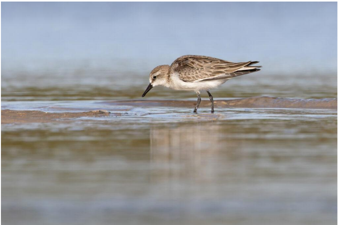
Red-necked Stint