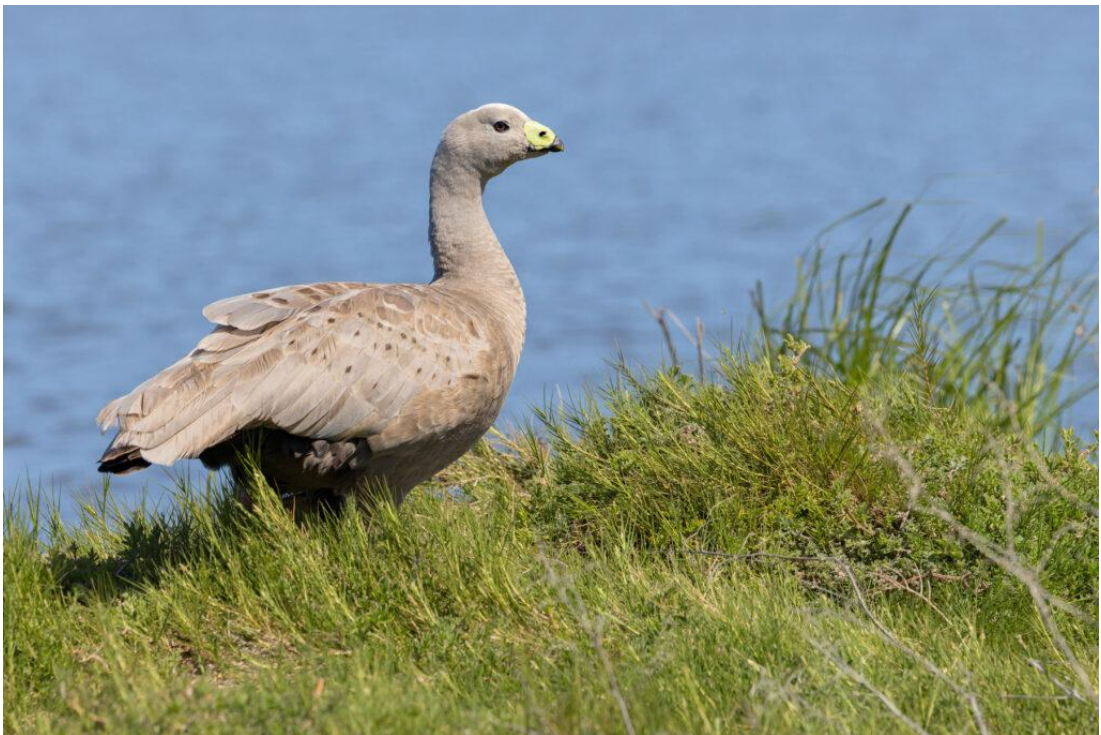
Cape Barren Goose