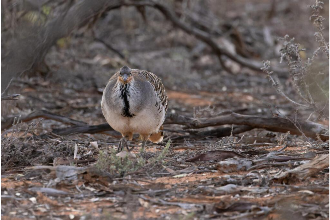
Malleefowl