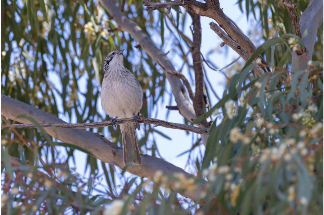
Striped Honeyeater