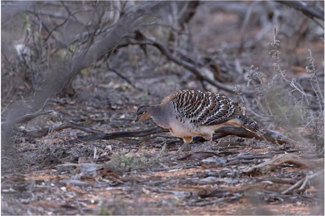
Malleefowl