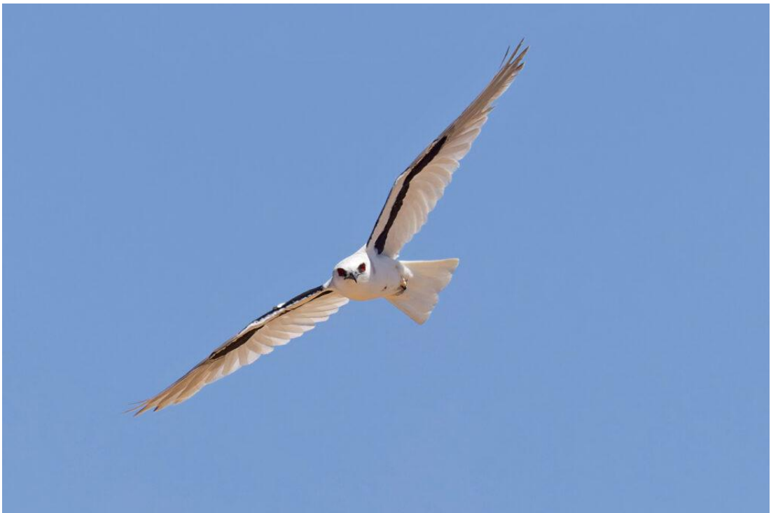
Letter-winged Kite