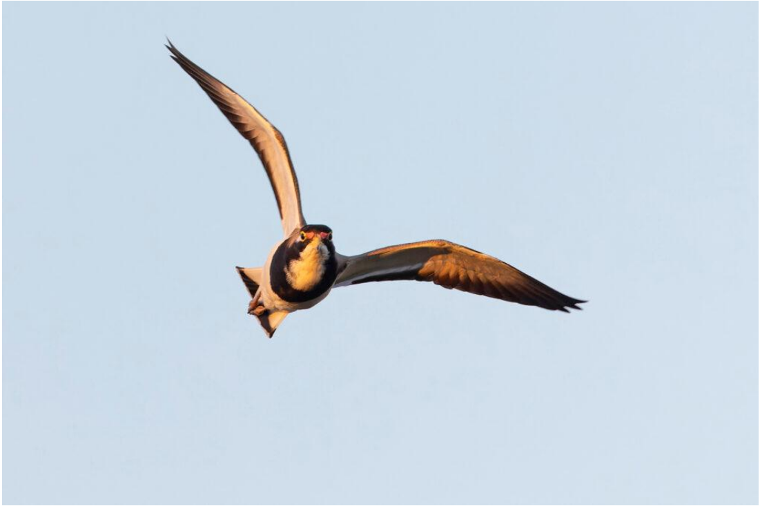
Banded Lapwing