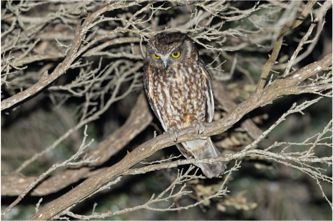
Tasmanian Boobook