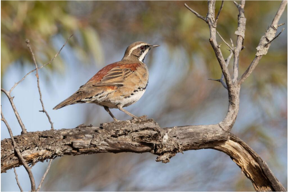
Copperback Quailthrush