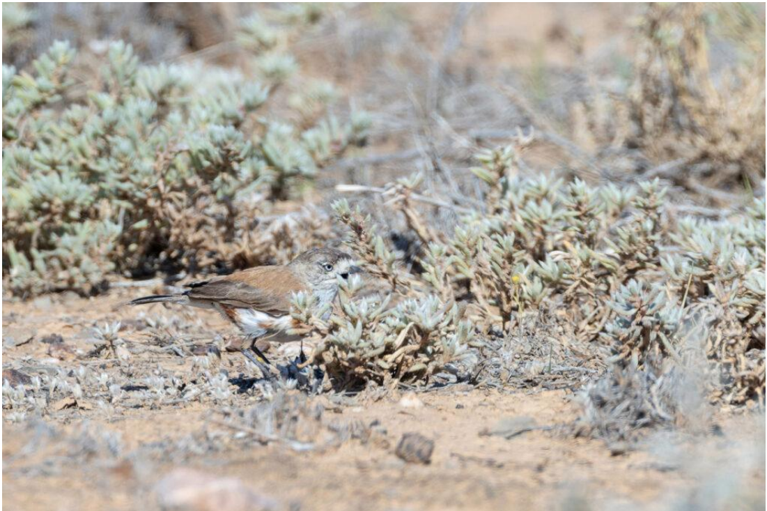
Chestnut-breasted Whiteface