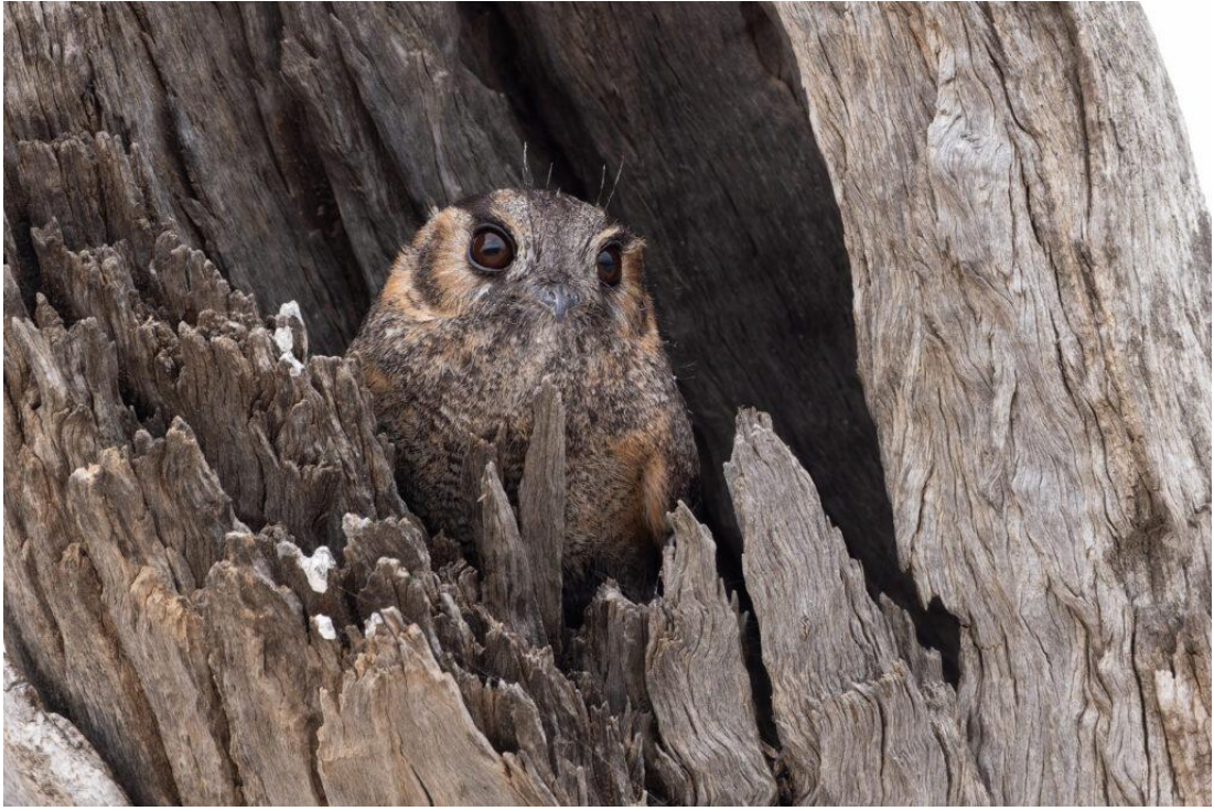
Australian Owlet-nightjar