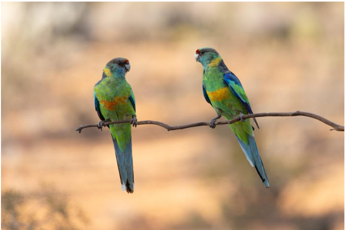
Australian "Mallee" Ringnecks