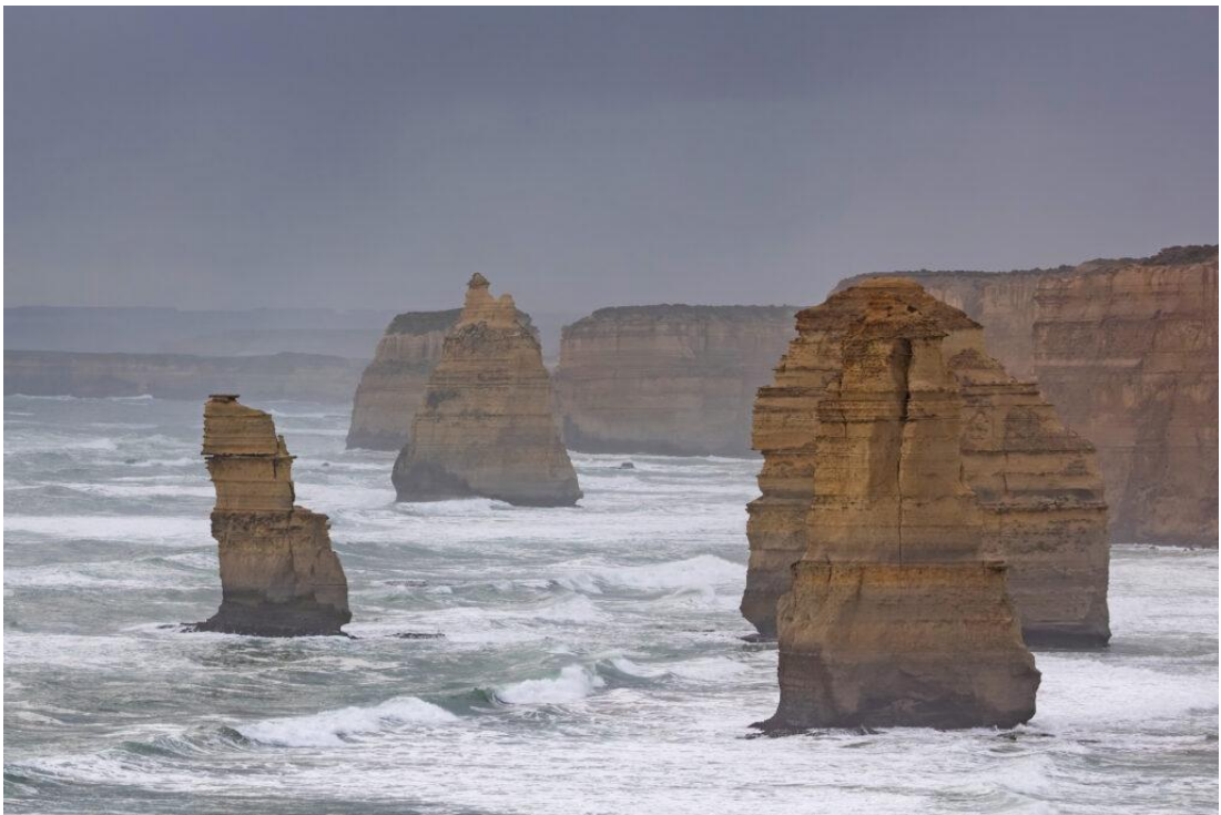
Twelve Apostles