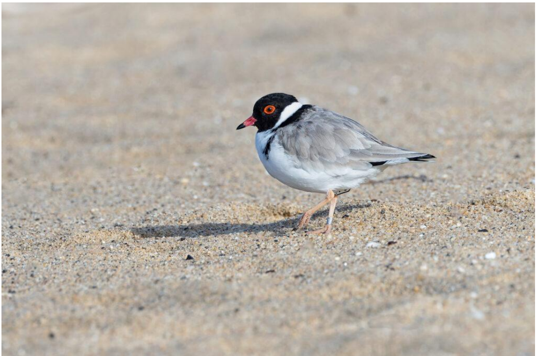
Hooded Plover