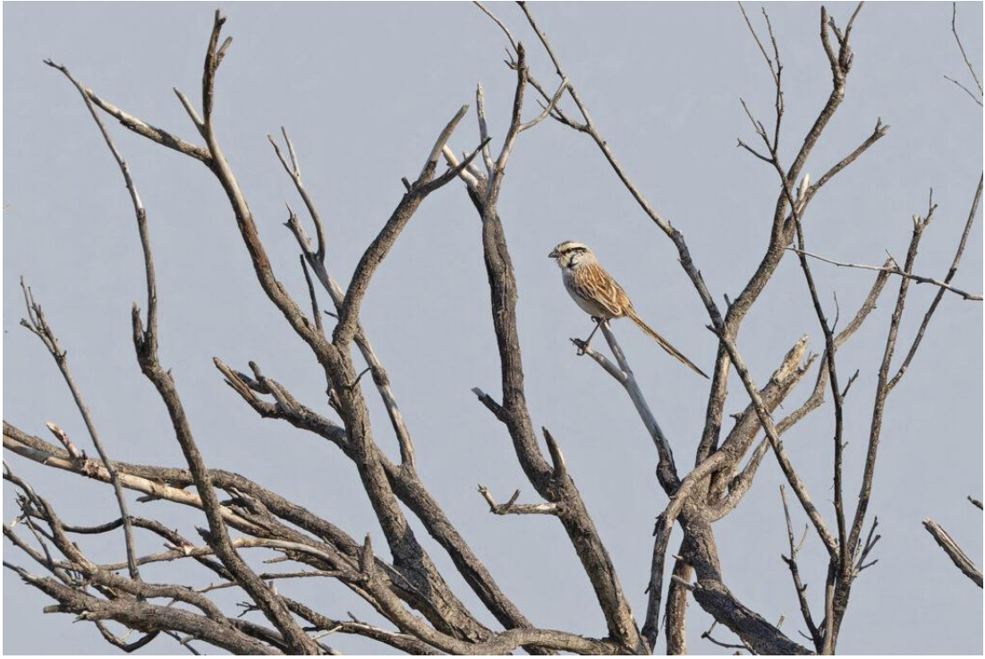
Grey Grasswren