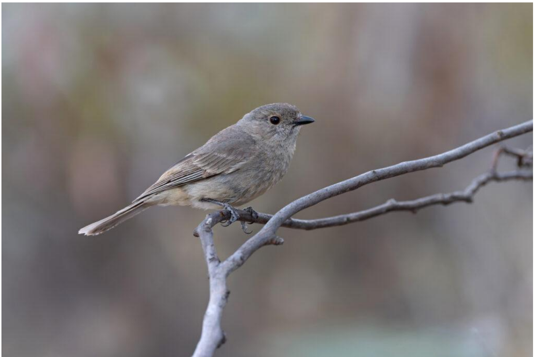
immature Red-lored Whistler