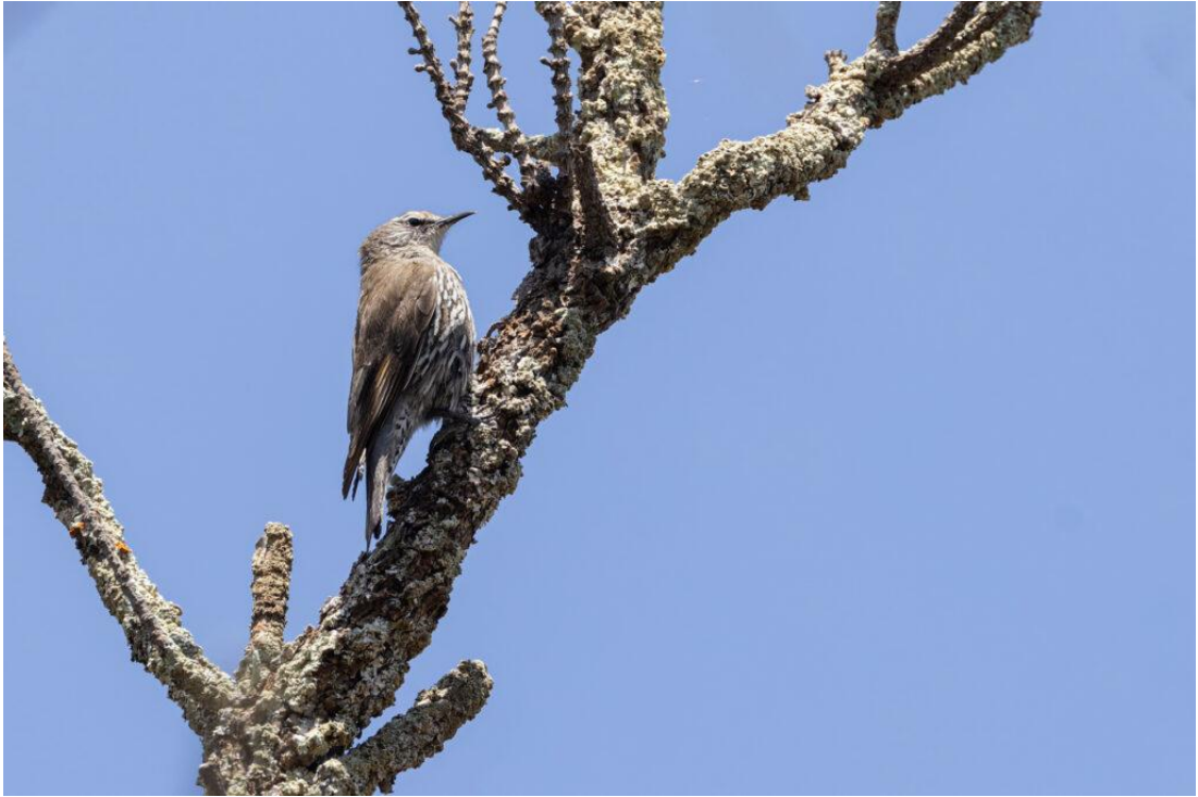
White-browed Treecreeper