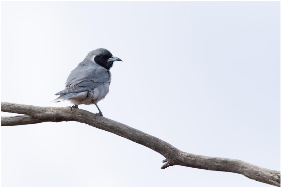
Masked Woodswallow