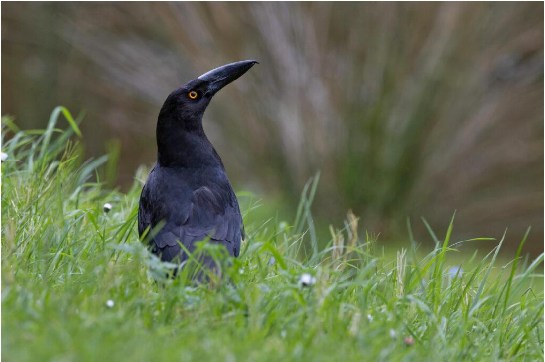
Black Currawong