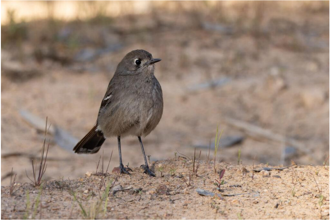
Southern Scrub Robin