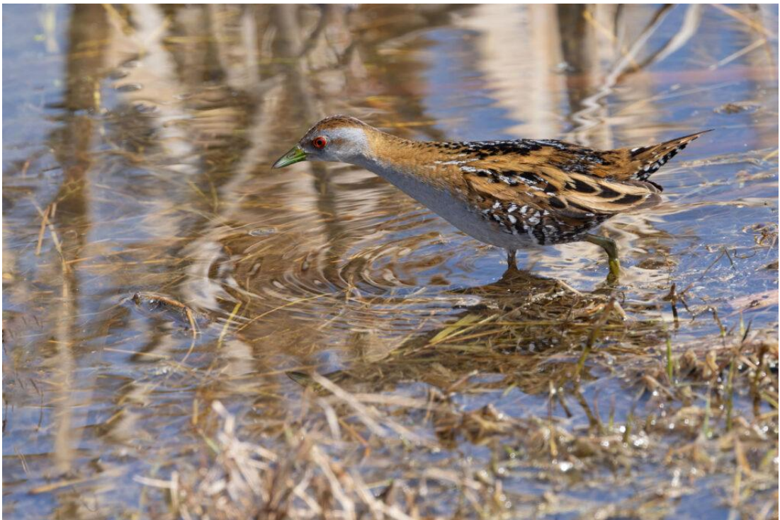
Baillon's Crake