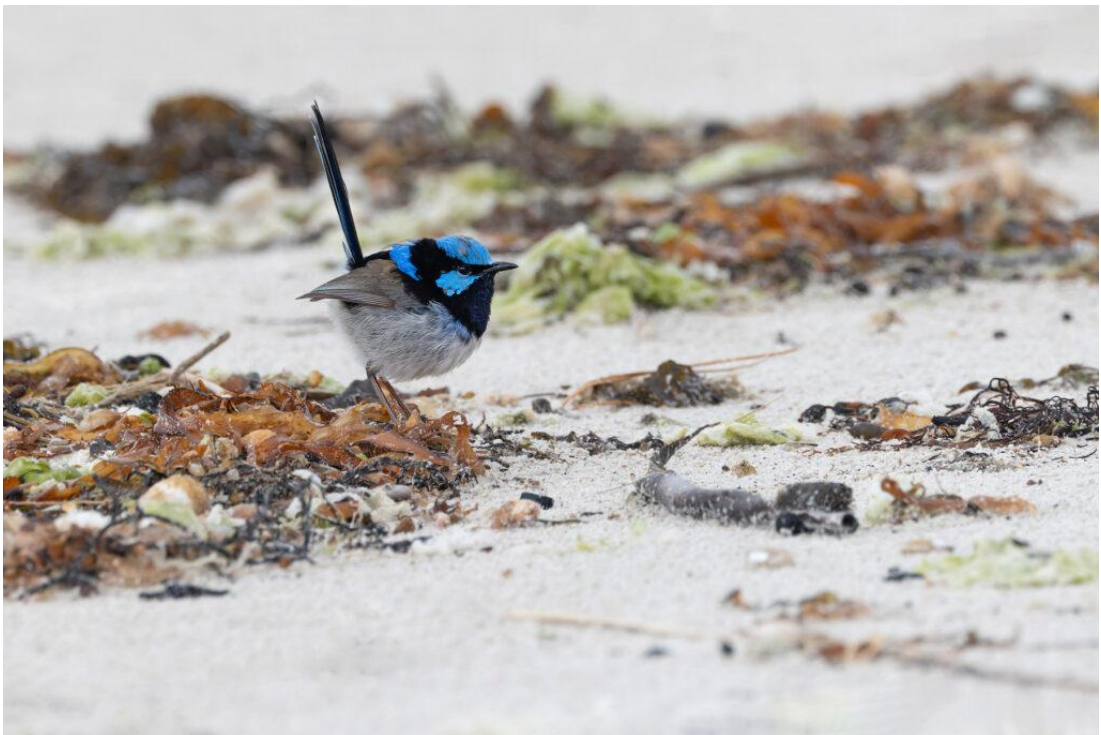
Superb Fairywren