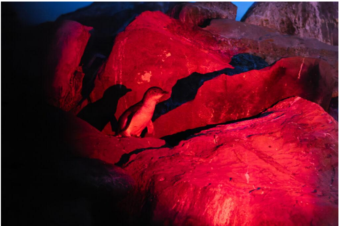
Little Penguin