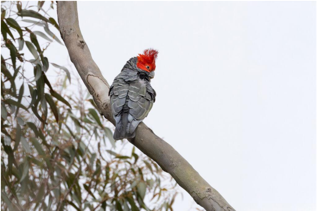
Gang-gang Cockatoo