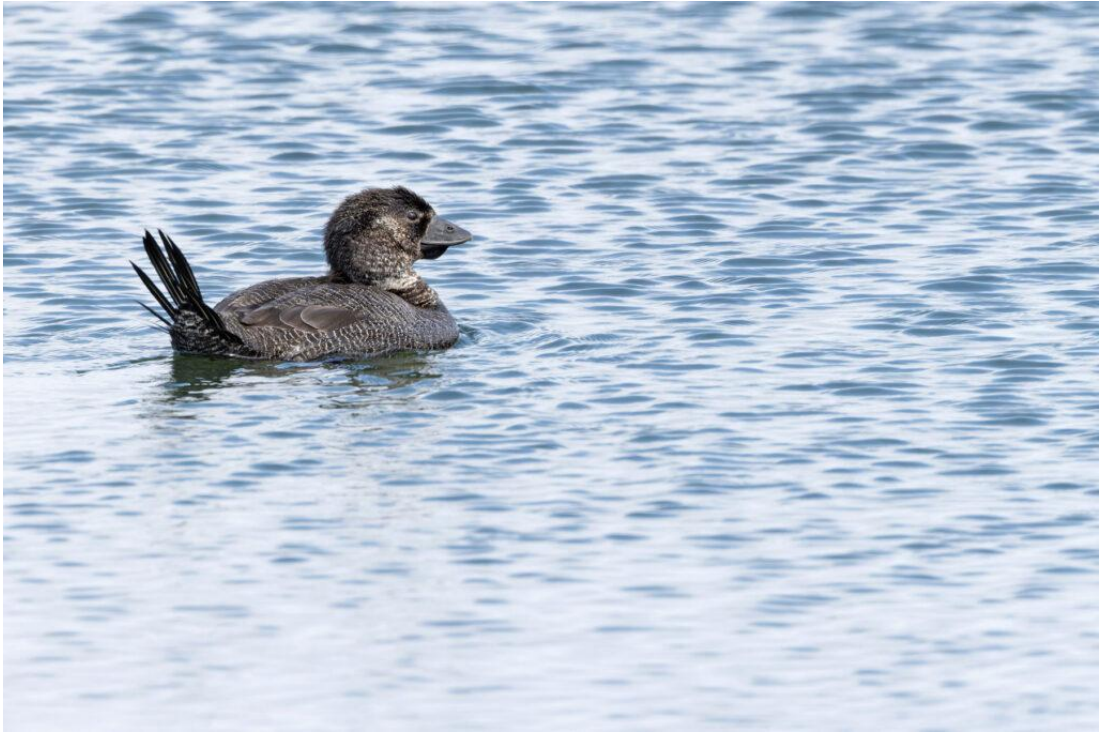
Musk Duck (image by Mike Watson)