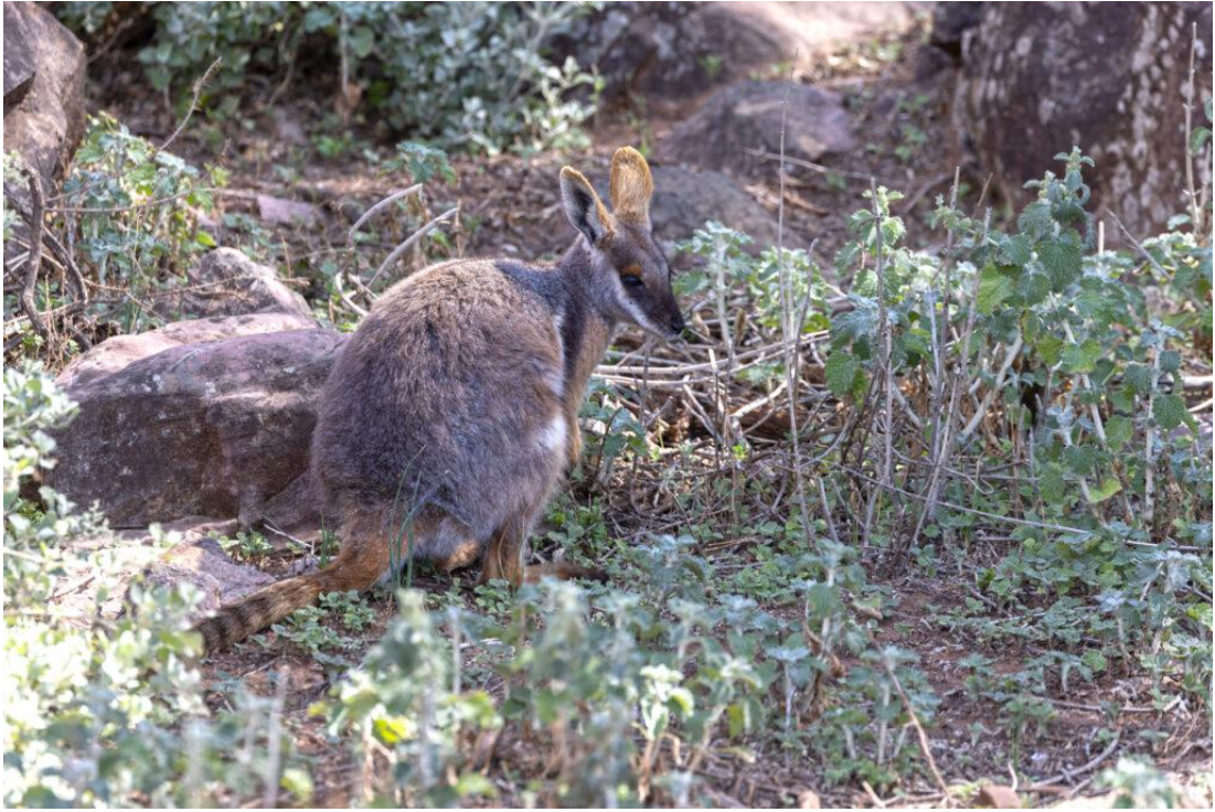
Yellow-footed Rock Wallaby

Central Bearded Dragon Pogona vitticeps 5 sightings from Deniliquin onwards. Eastern Brown Snake Pseudonaja textilis 1 Wyperfield NP. Sand Goanna Varanus gouldii Noted Murray Sunset NP & Brachina Gorge.