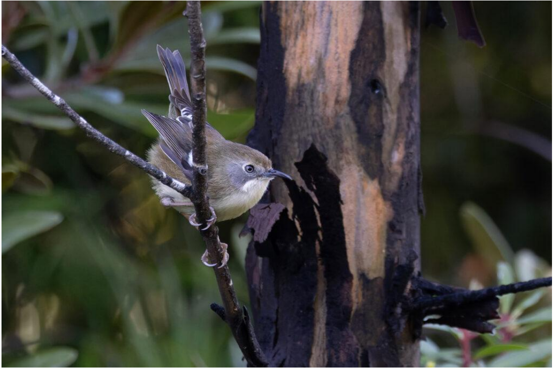
Scrubtit