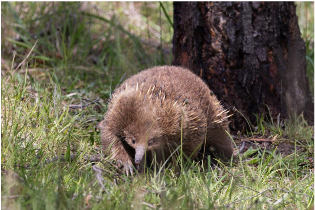
Short-beaked Echidna