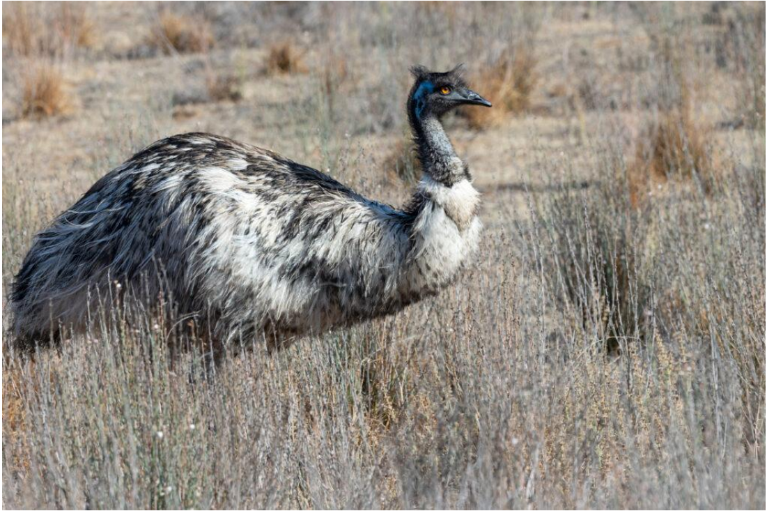
Emu