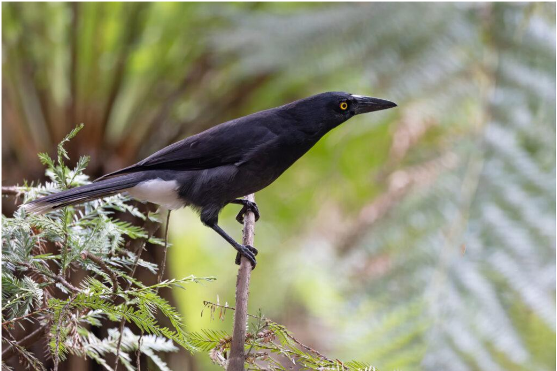
Grey Currawong