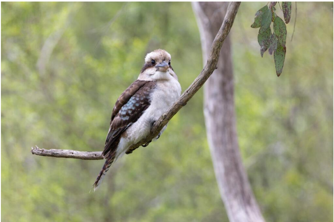
Laughing Kookaburra