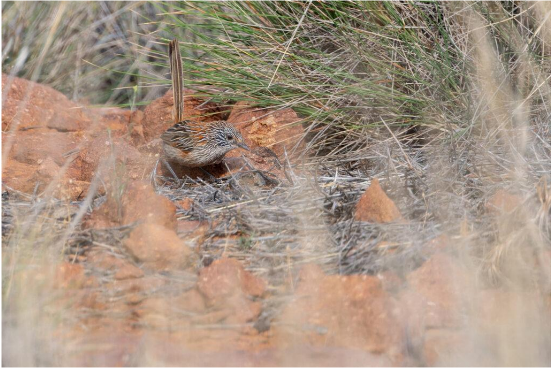
Short-tailed Grasswren