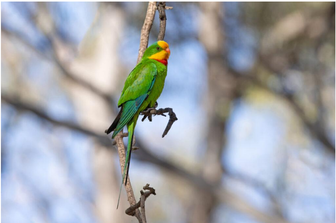
Superb Parrot