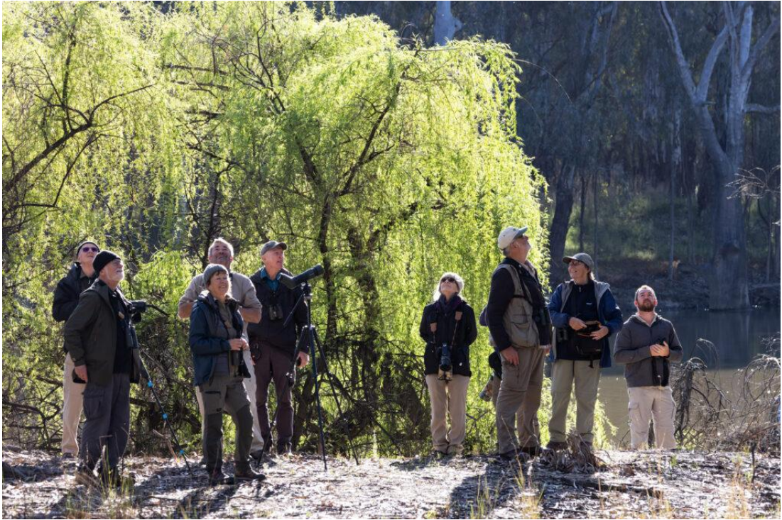
Birding at Deniliquin