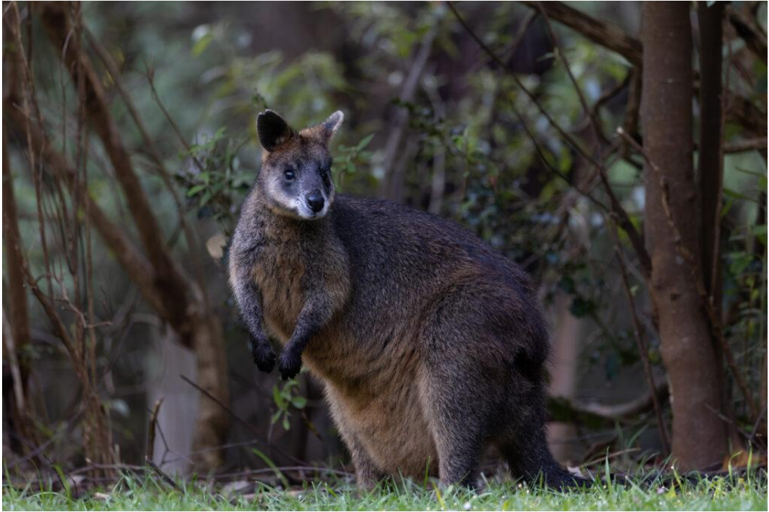
Swamp Wallaby