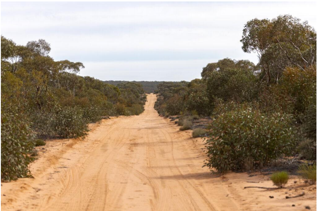
Mallee Murray-Sunset NP