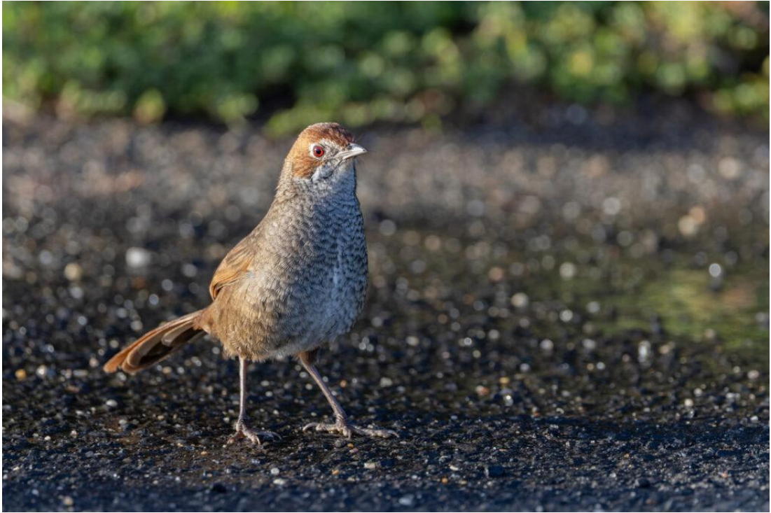
Rufous Bristlebird