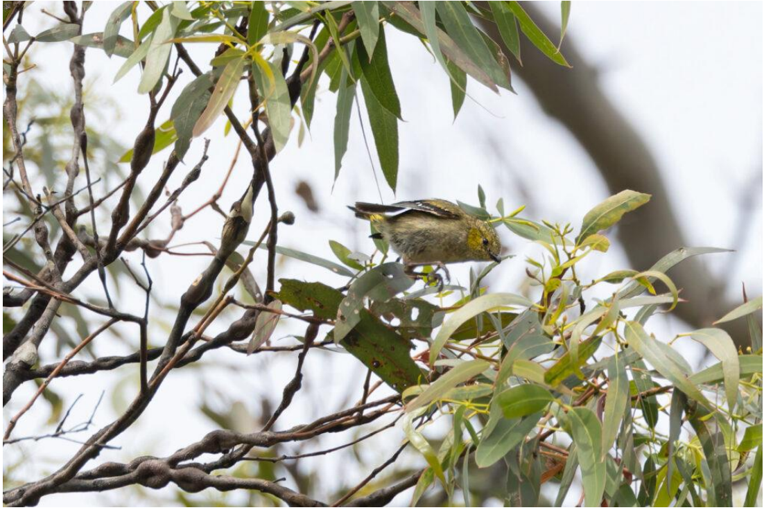
Forty-spotted Pardalote