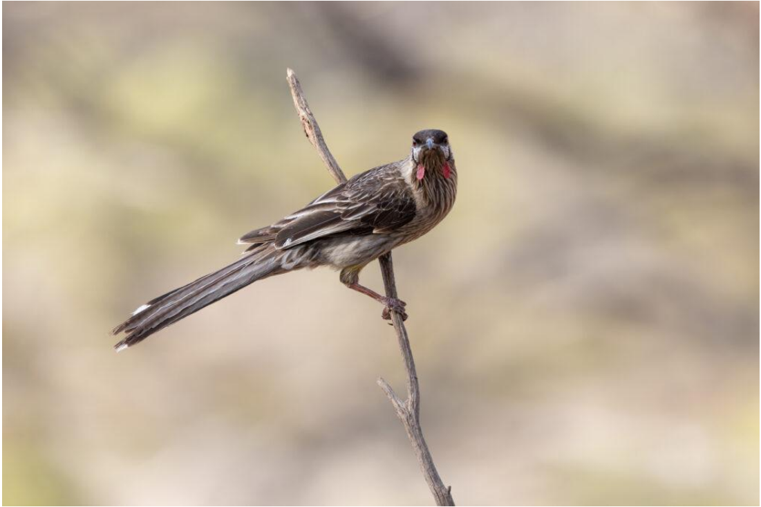
Red Wattlebird