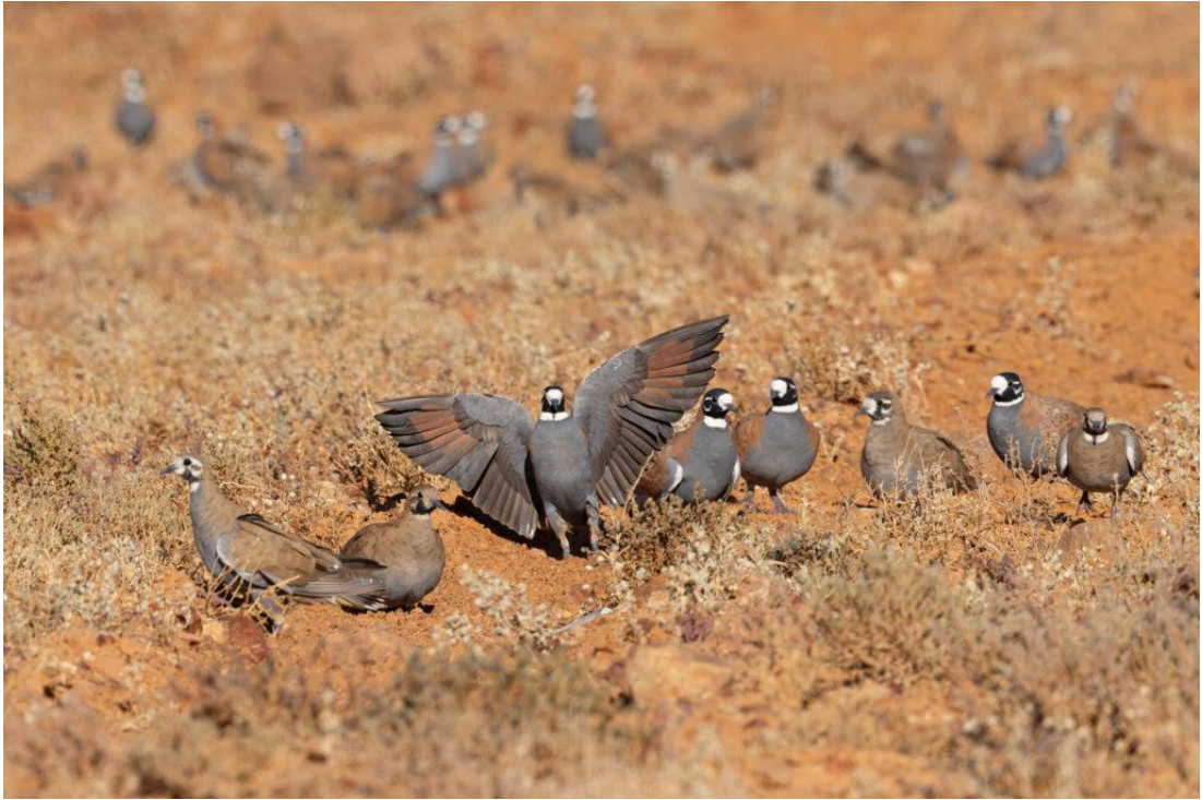
Flock Bronzewings