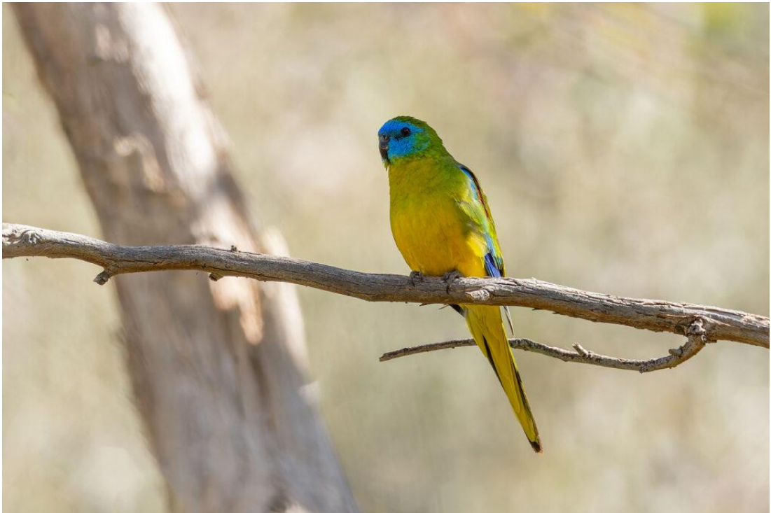
Turquoise Parrot