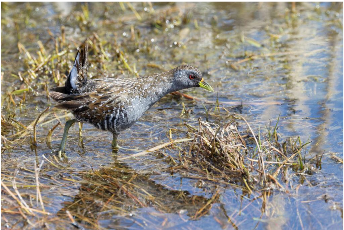
Australian Crake