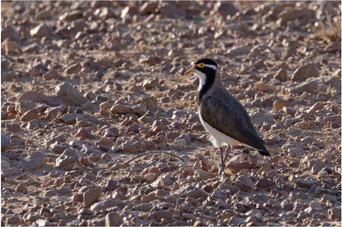
Banded Lapwing