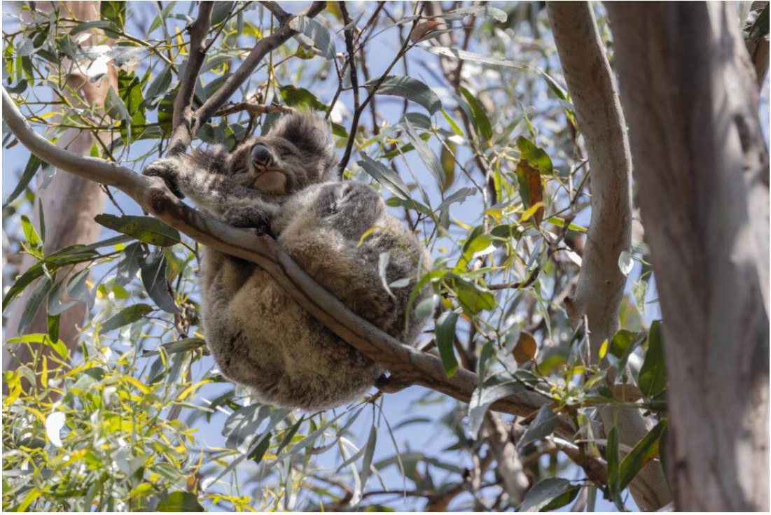
Koala