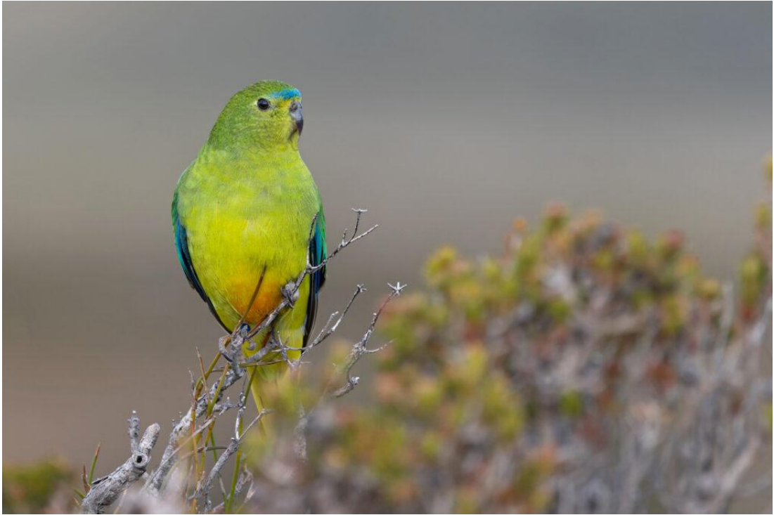
Orange-bellied Parrot