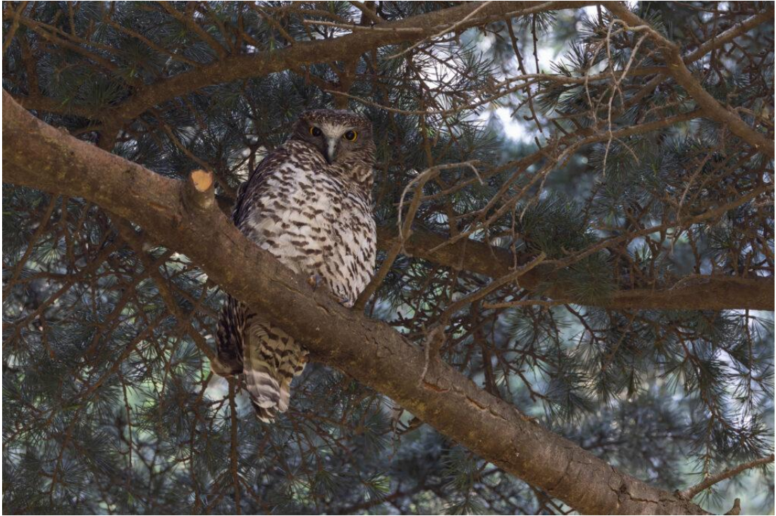
Powerful Owl