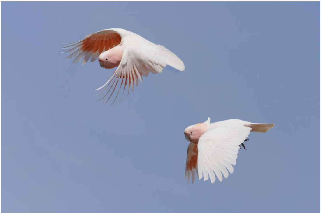
Pink Cockatoo