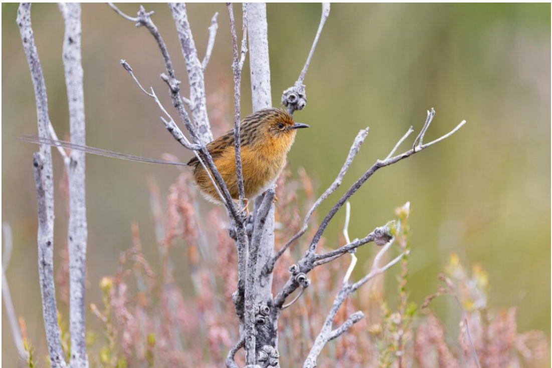
Southern Emu-wren