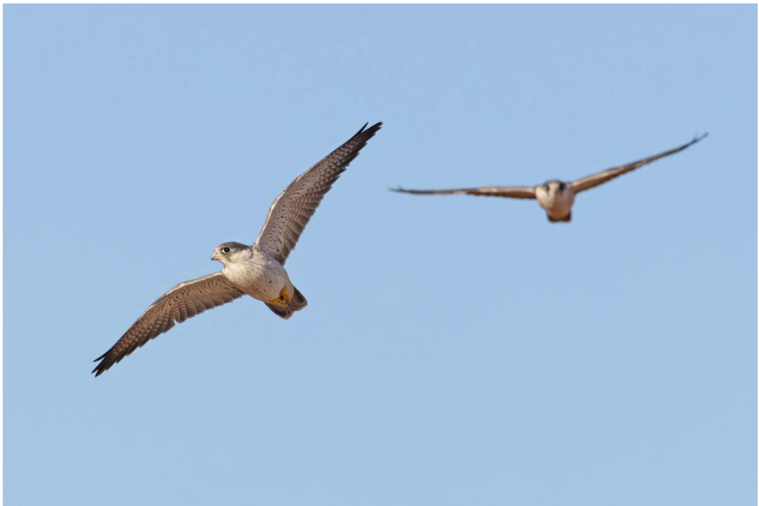
Grey Falcons