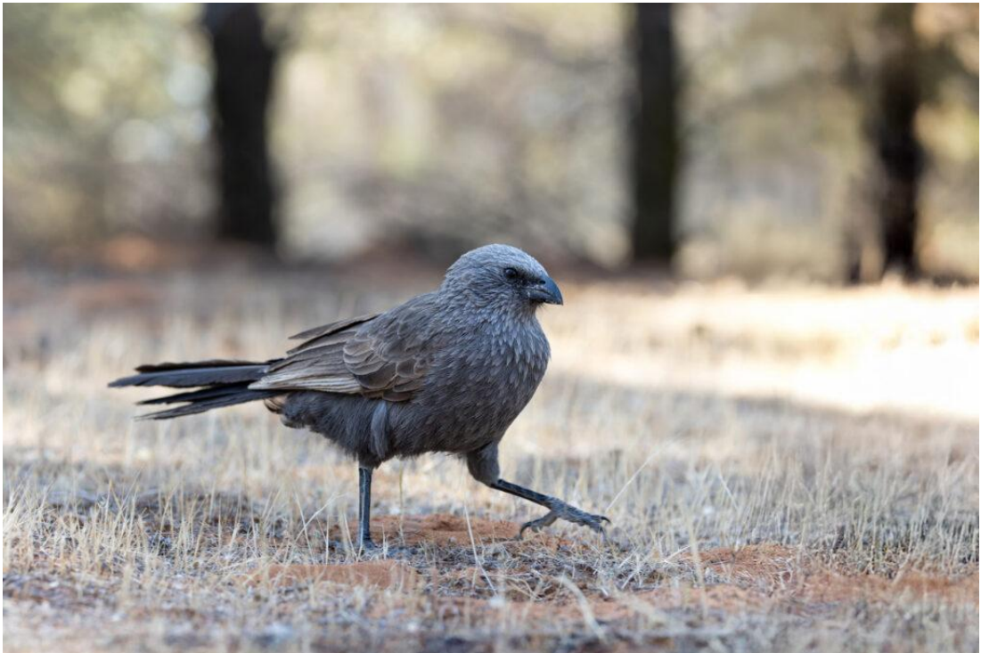
Apostlebird