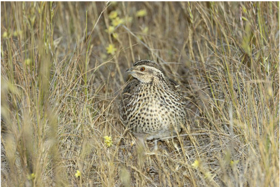
female Stubble Quail (image by Mike Watson)