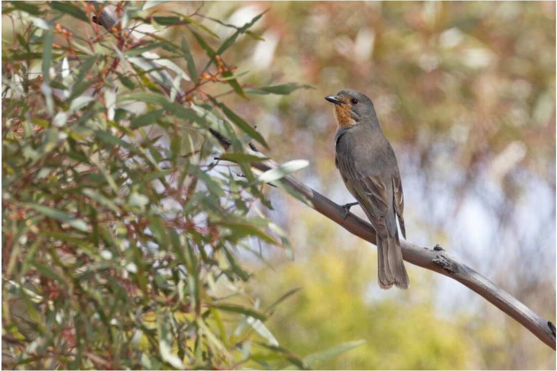
male Red-lored Whistler