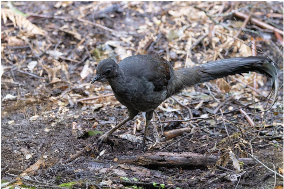
Superb Lyrebird