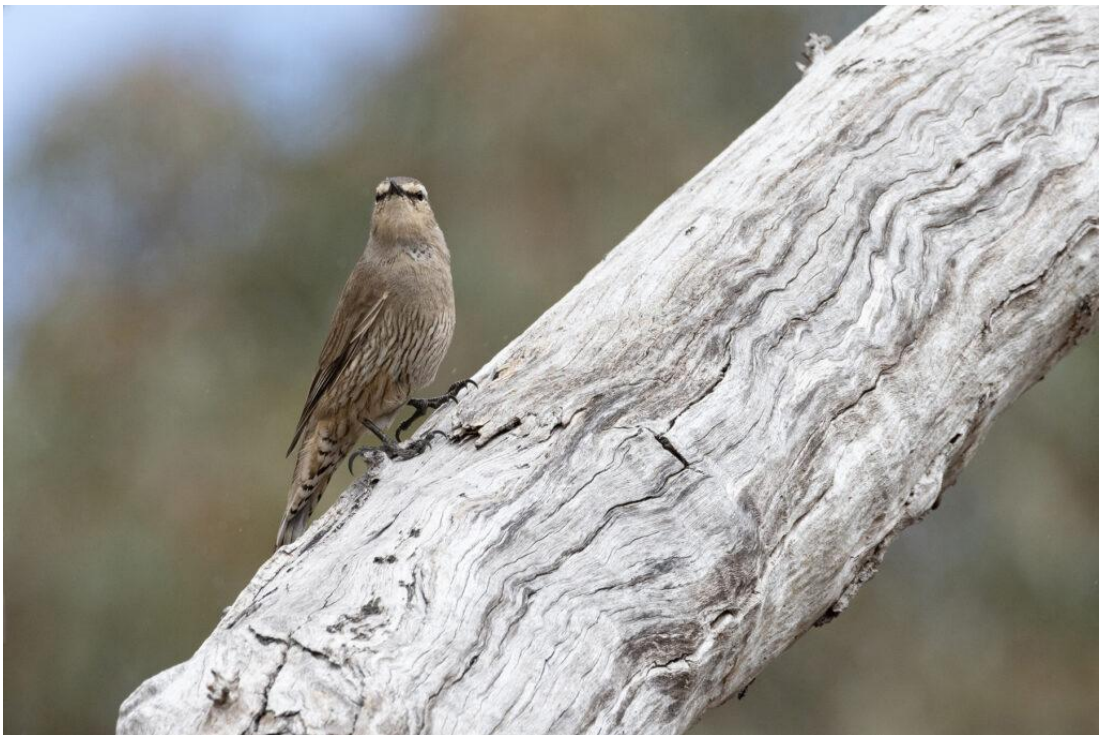
Brown Treecreeper