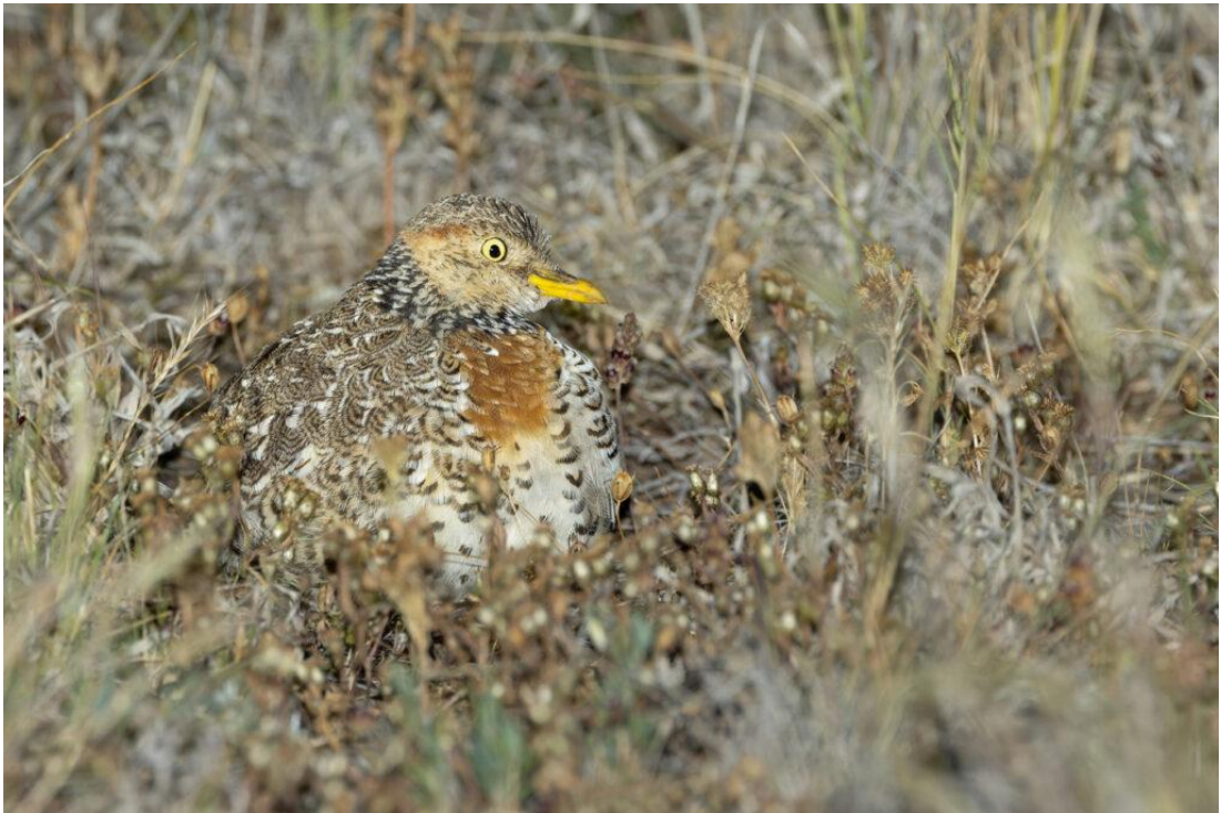
female Plains-wanderer