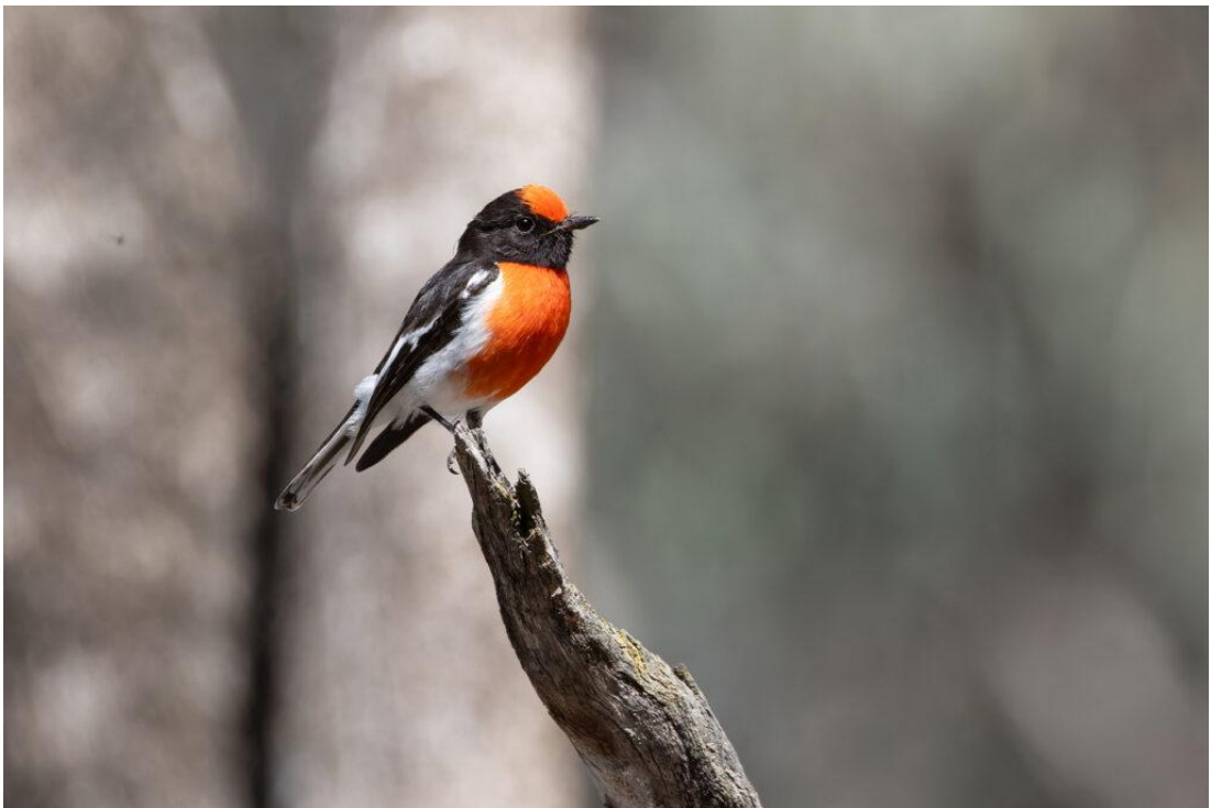
Red-capped Robin