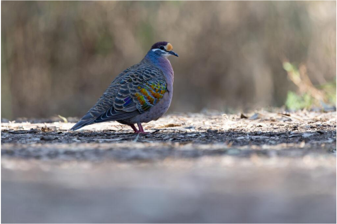
Common Bronzewing