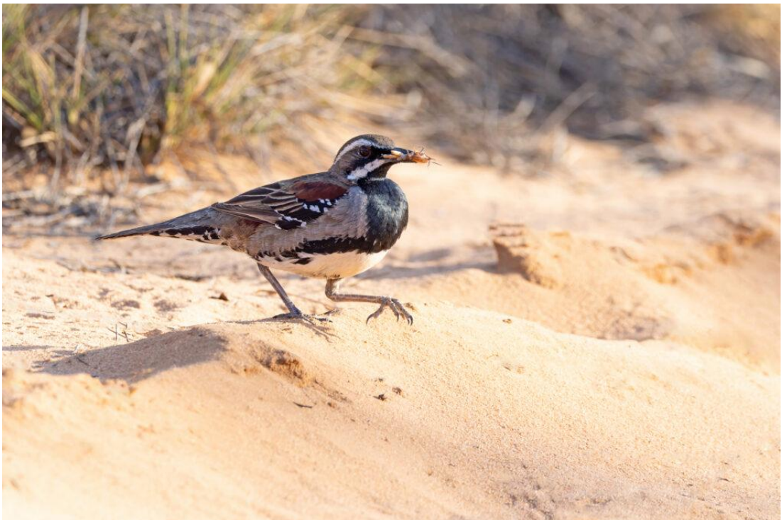
Chestnut Quailthrush