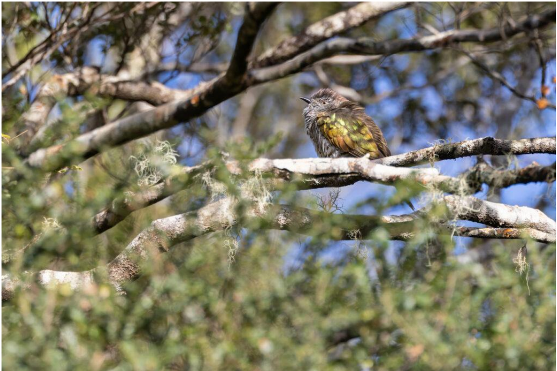
Shining Bronze Cuckoo