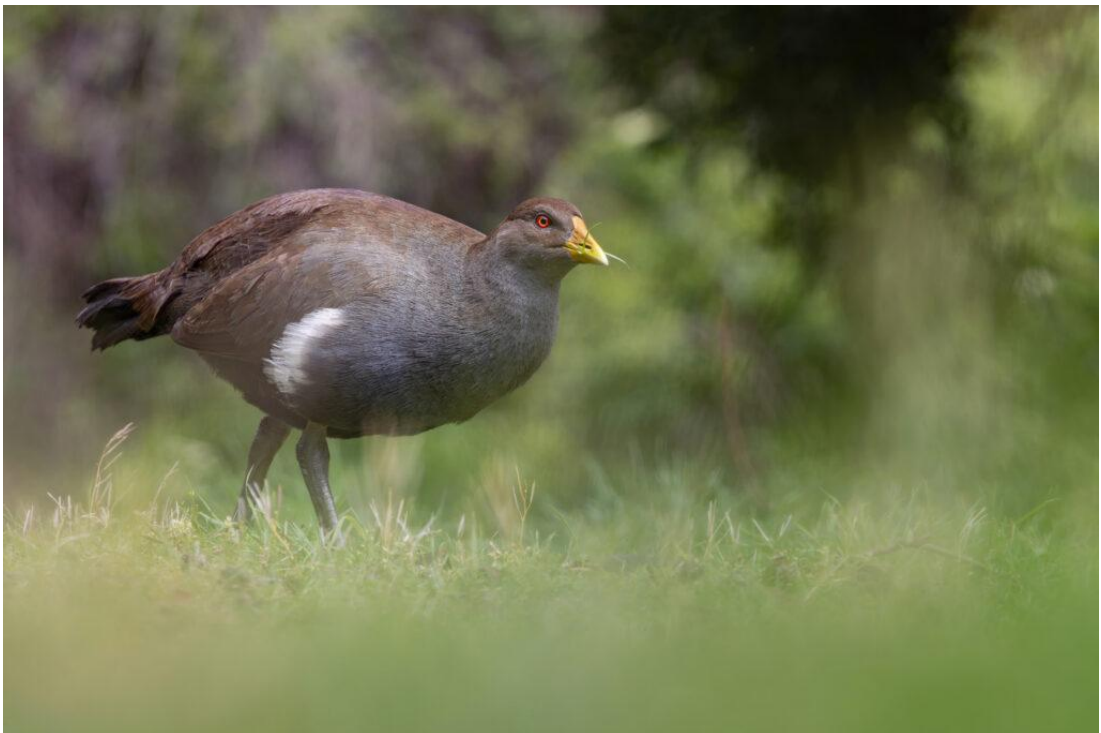
Tasmanian Nativehen