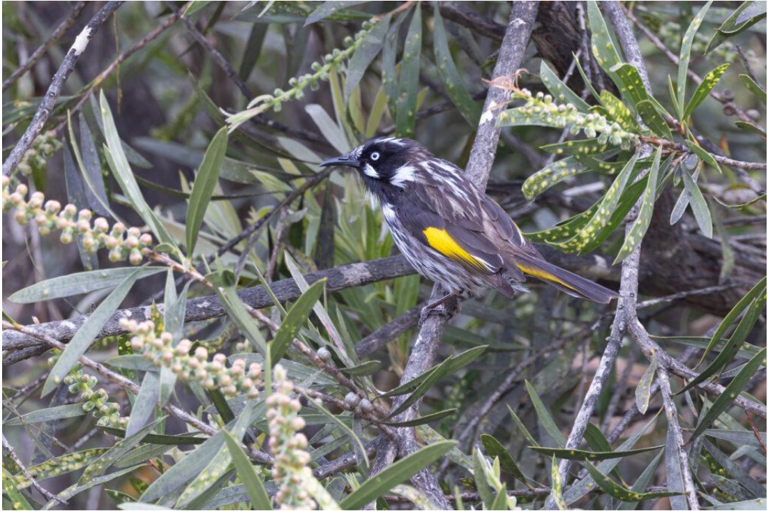
New Holland Honeyeater