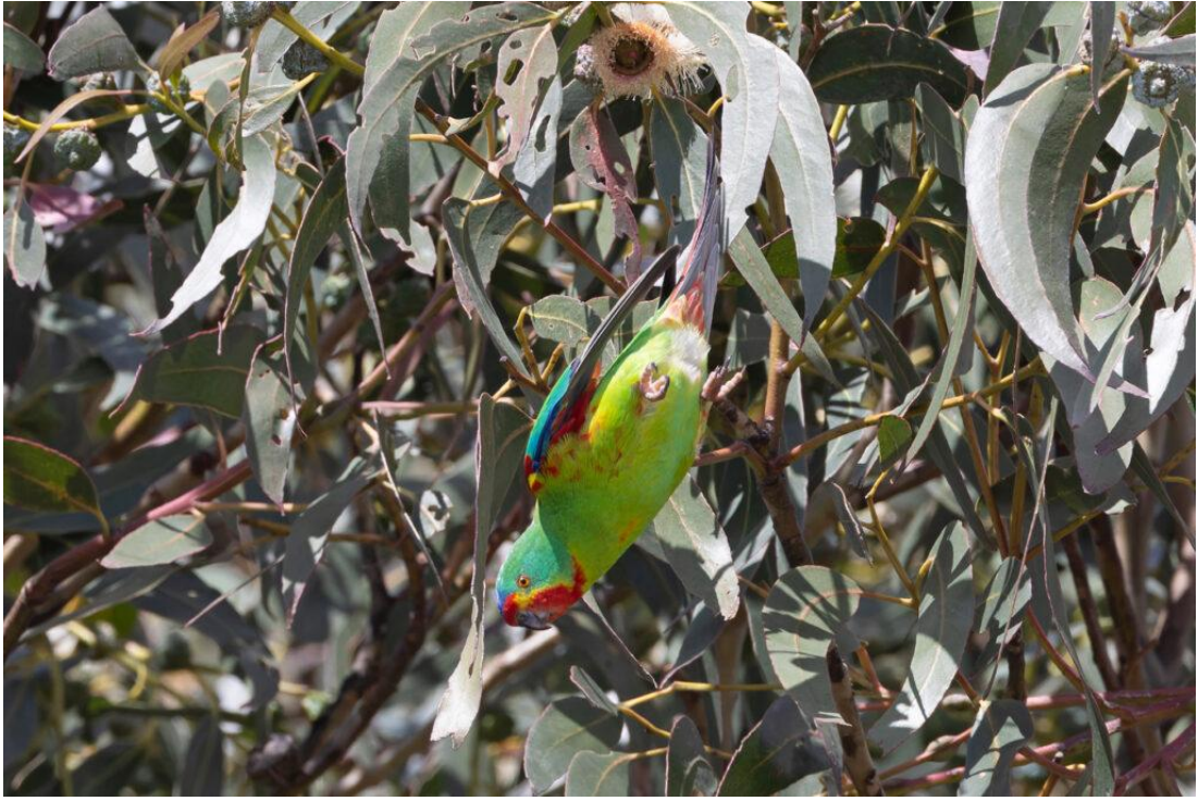
Swift Parrot