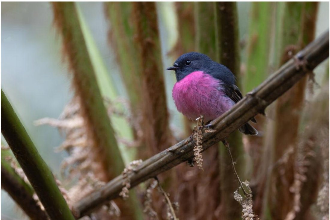
Pink Robin