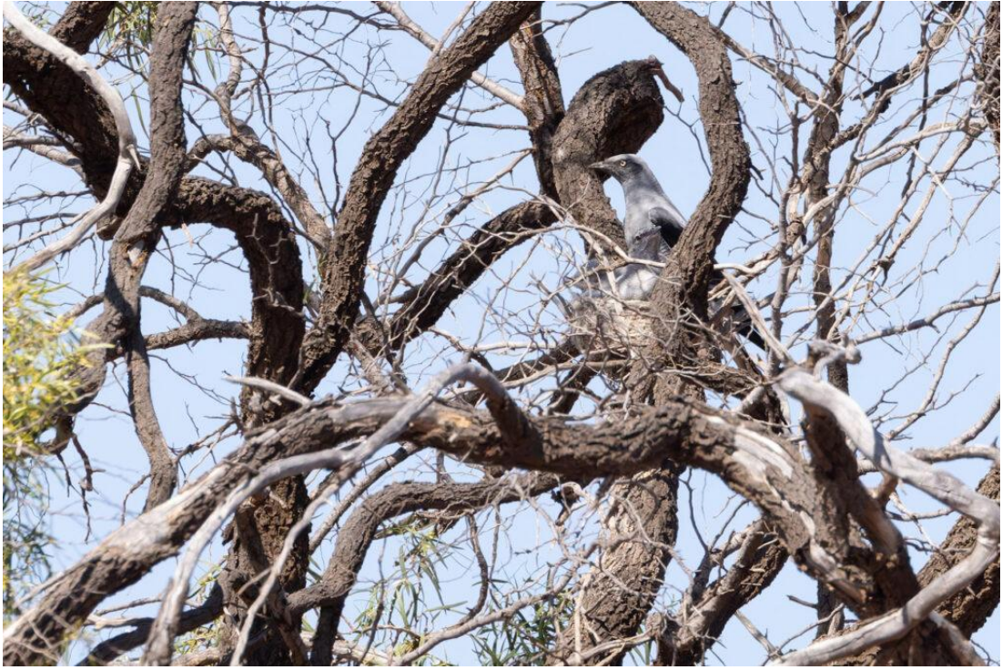
Ground Cuckooshrike on nest