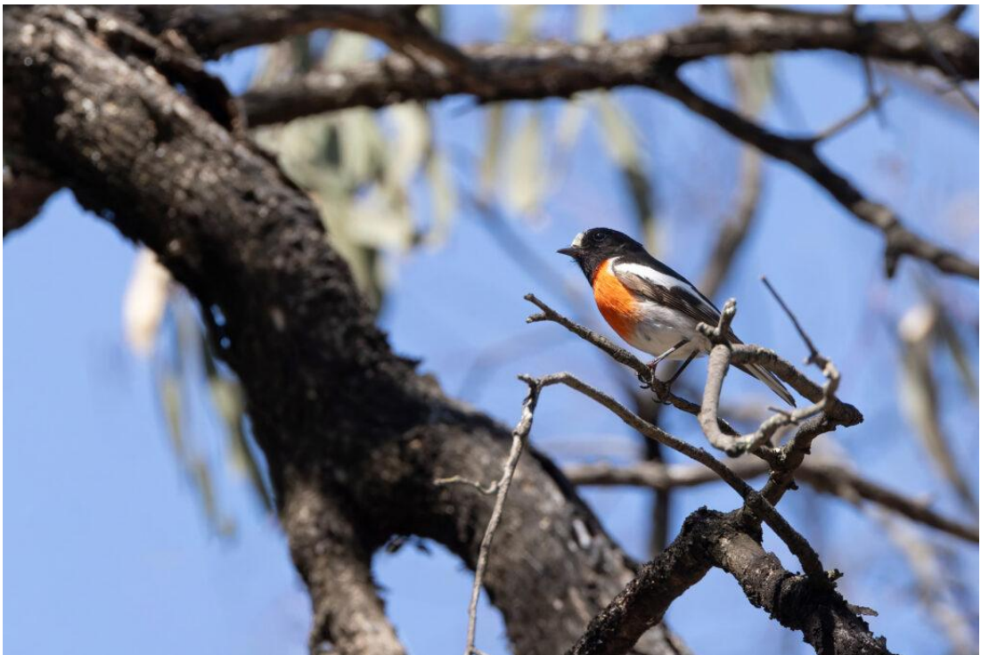
Scarlet Robin