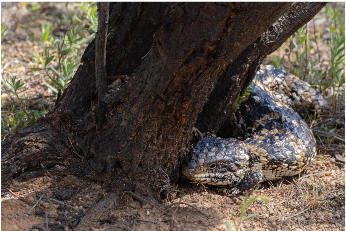
Shingleback