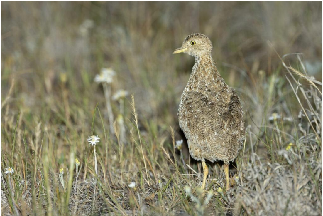
male Plains-wanderer