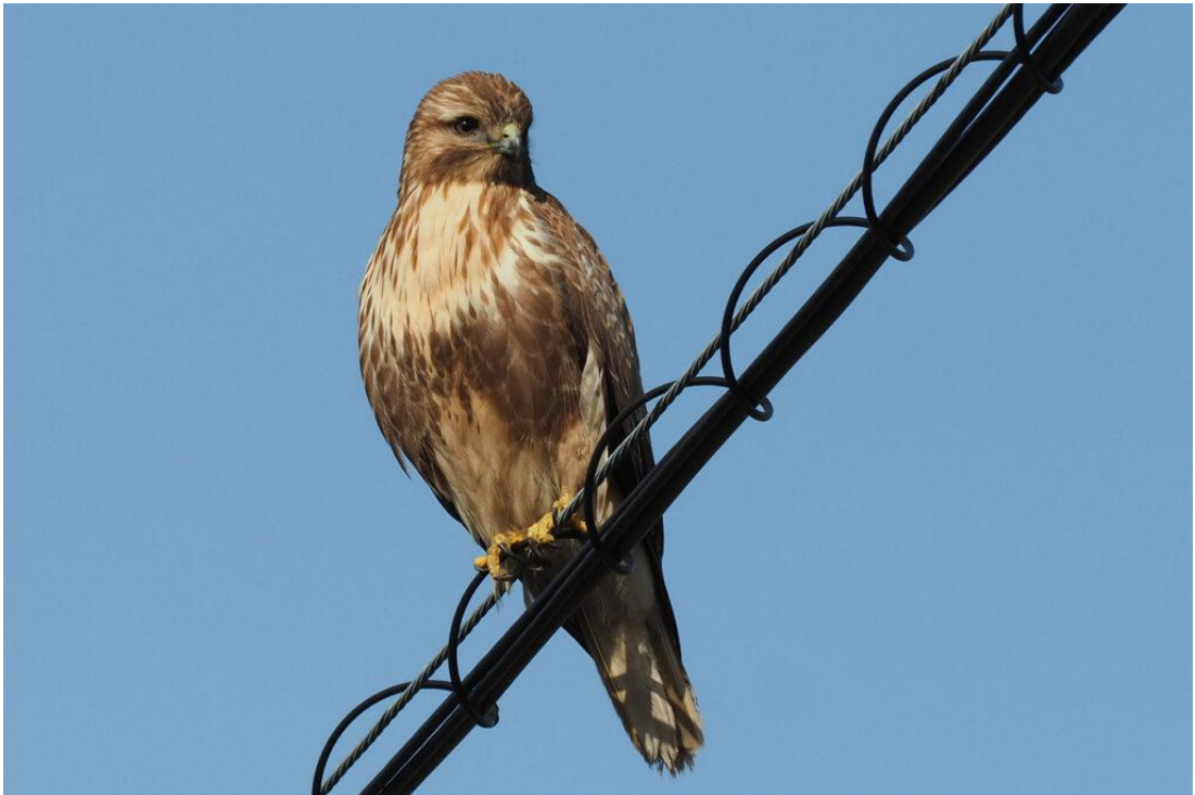
Eastern Buzzard