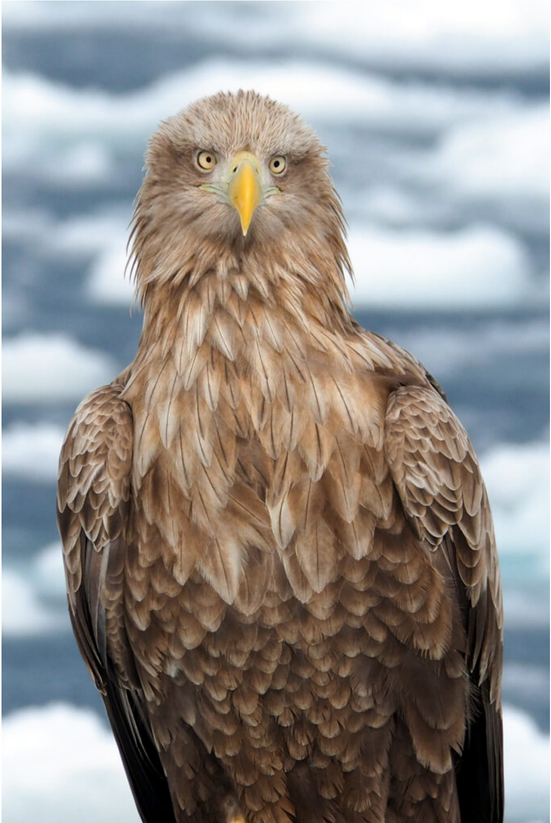
White-tailed Eagle