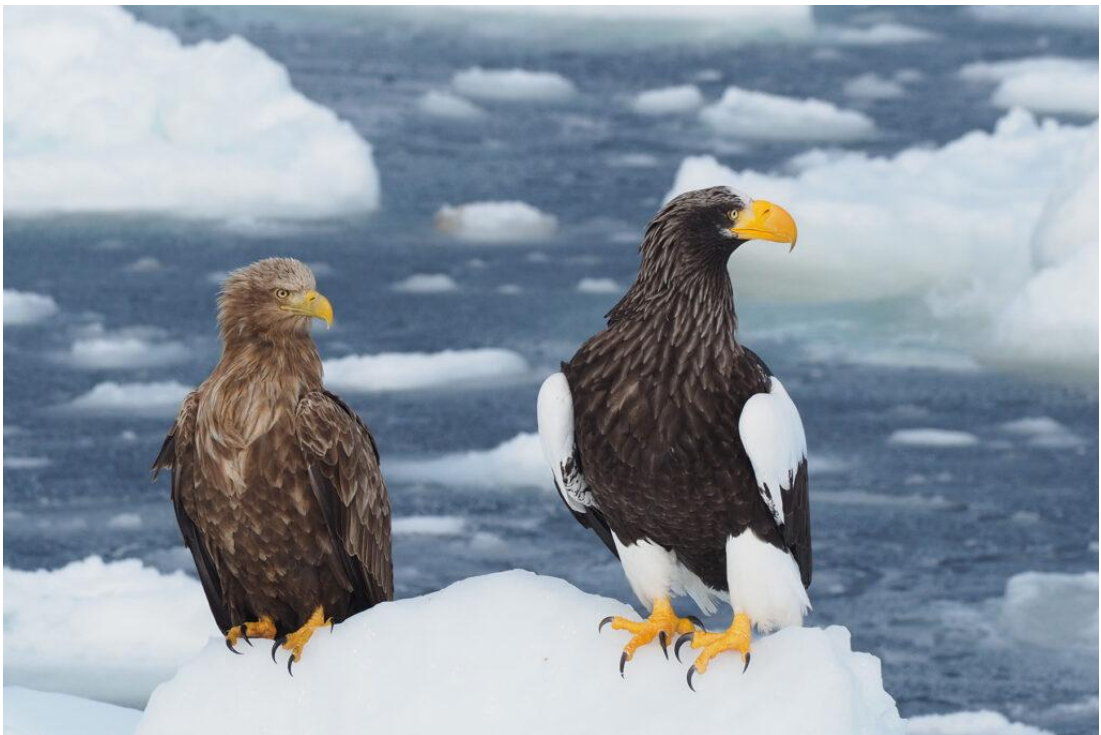
White-tailed Eagle and Steller's Sea Eagle