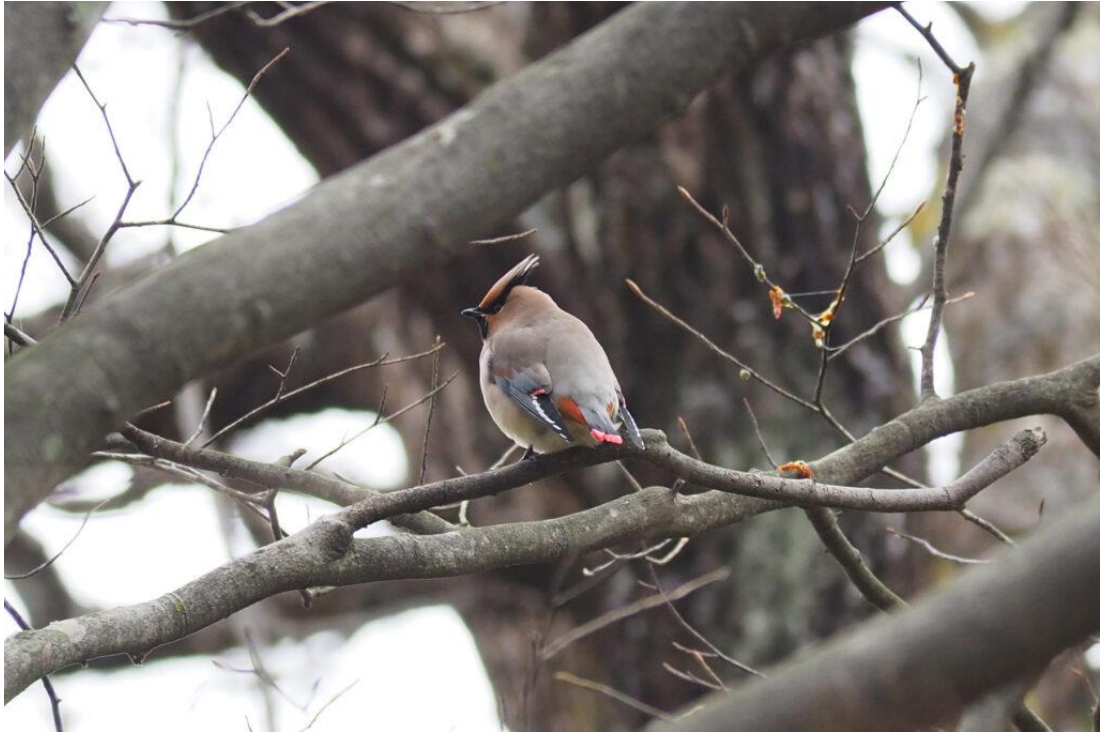
Japanese Waxwing