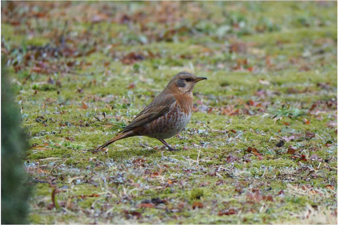
Naumann's Thrush (image by Dave Farrow)