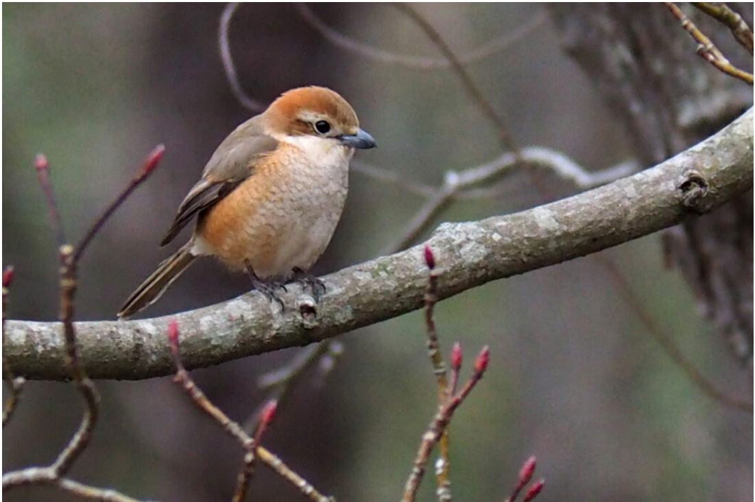
Bull-headed Shrike