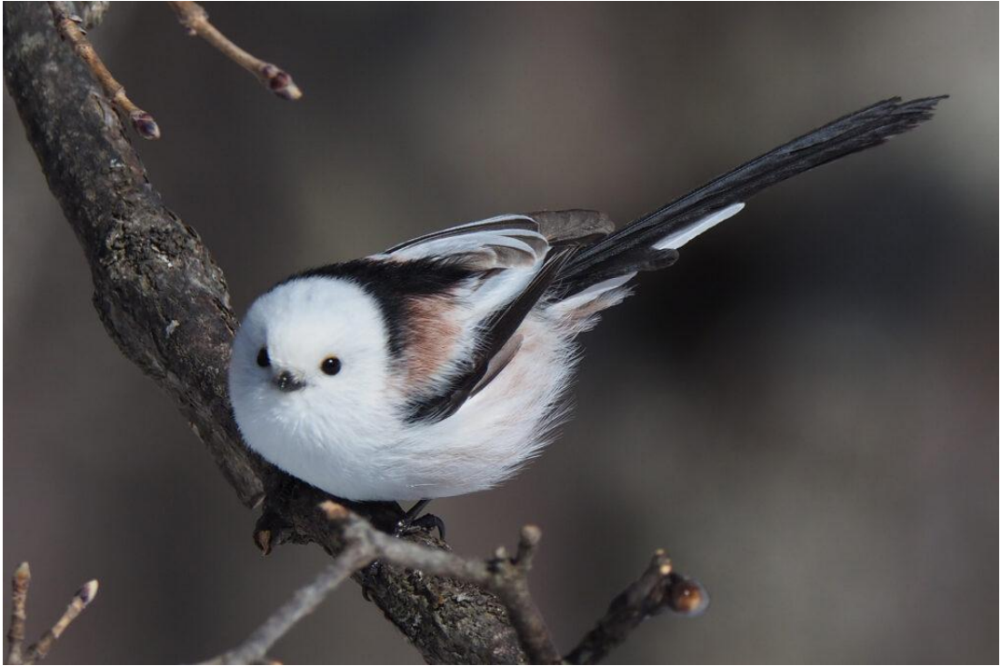
Long-tailed Tit