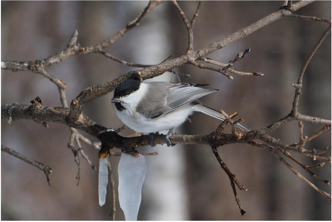
Marsh Tit