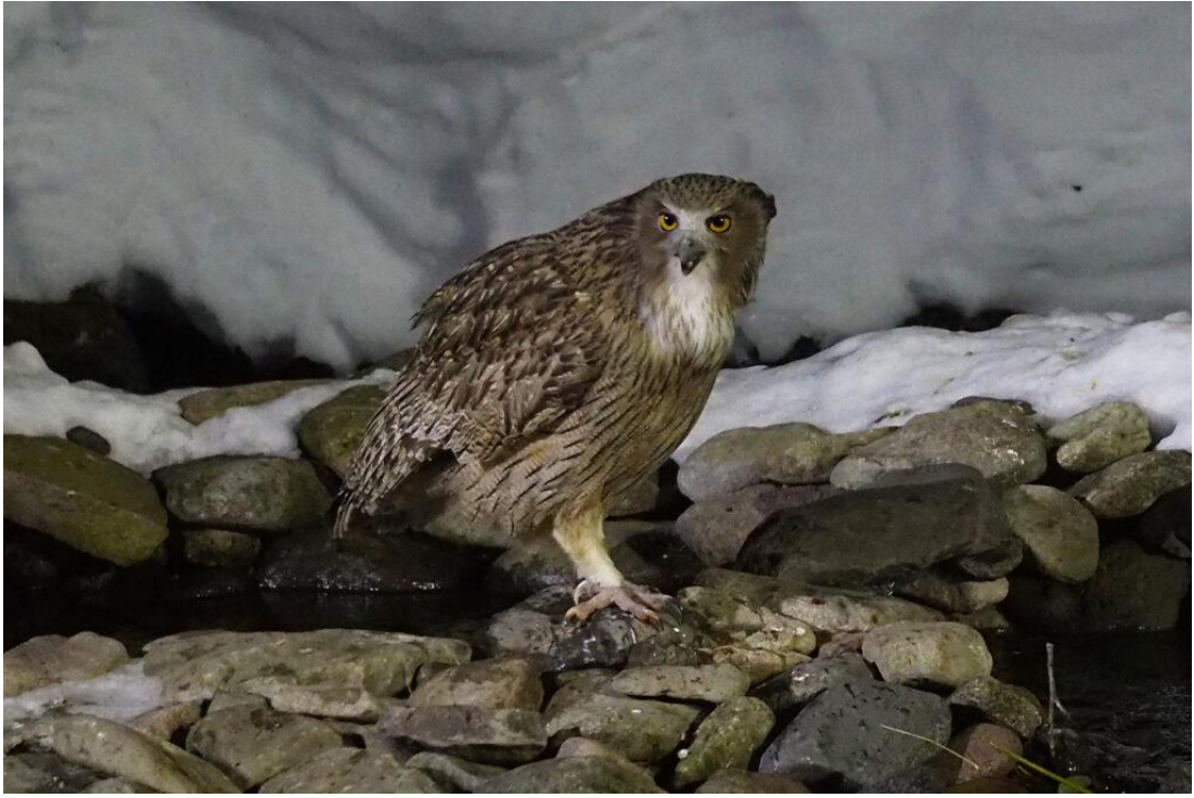
Blakiston's Fish Owl