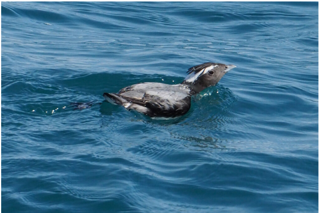
Japanese Murrelet