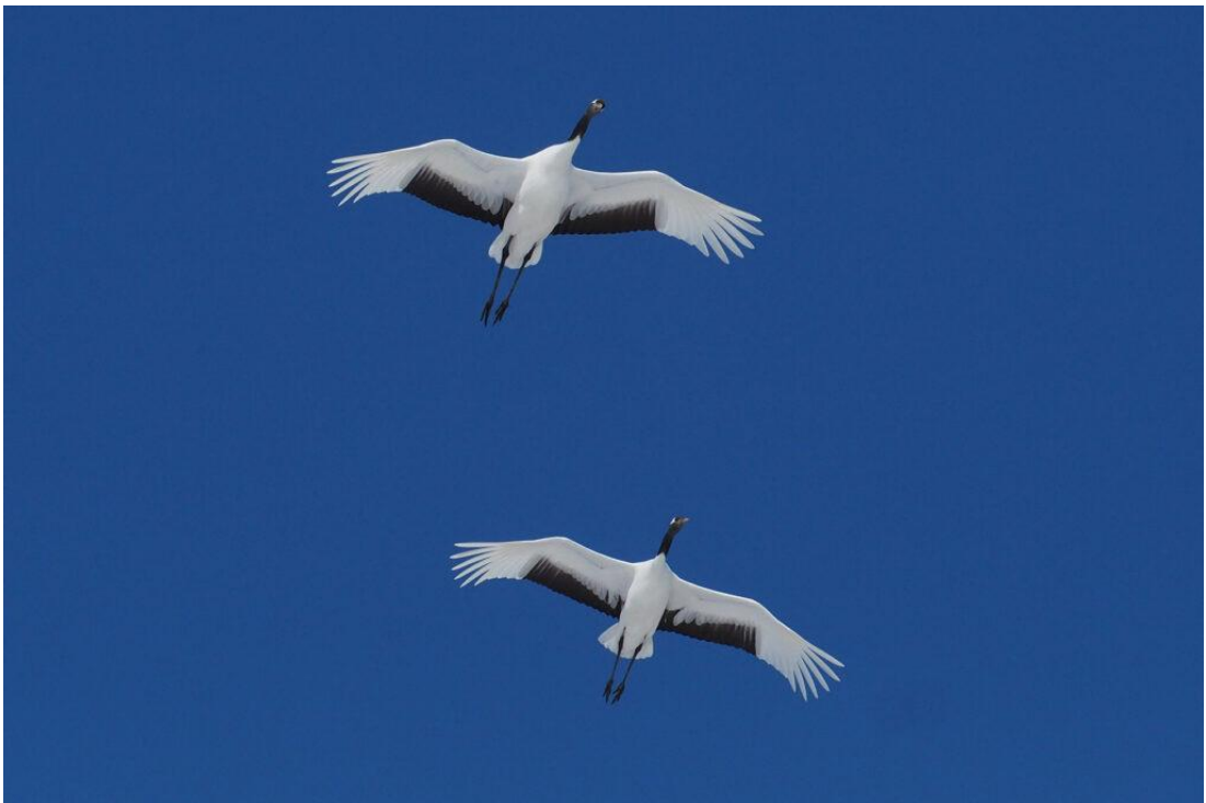
Red-crowned Cranes