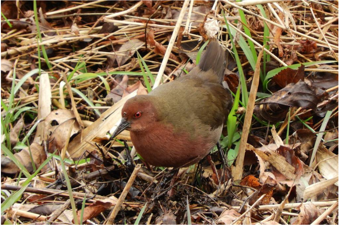
Ruddy-breasted Crake