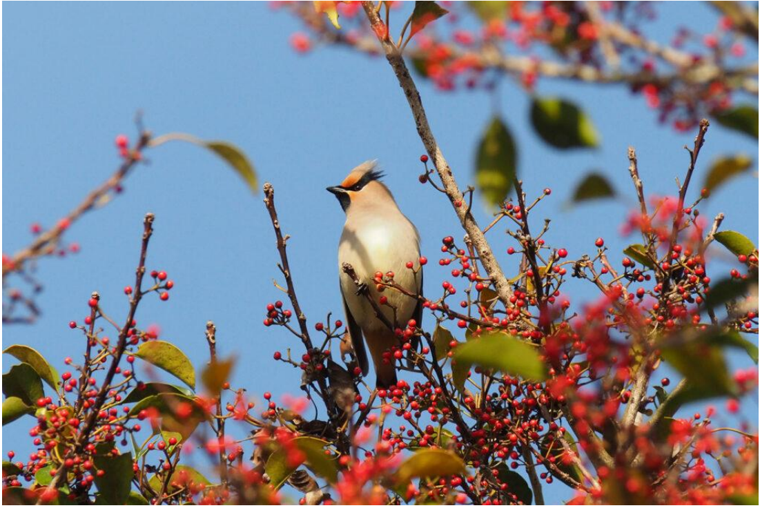
Japanese Waxwing