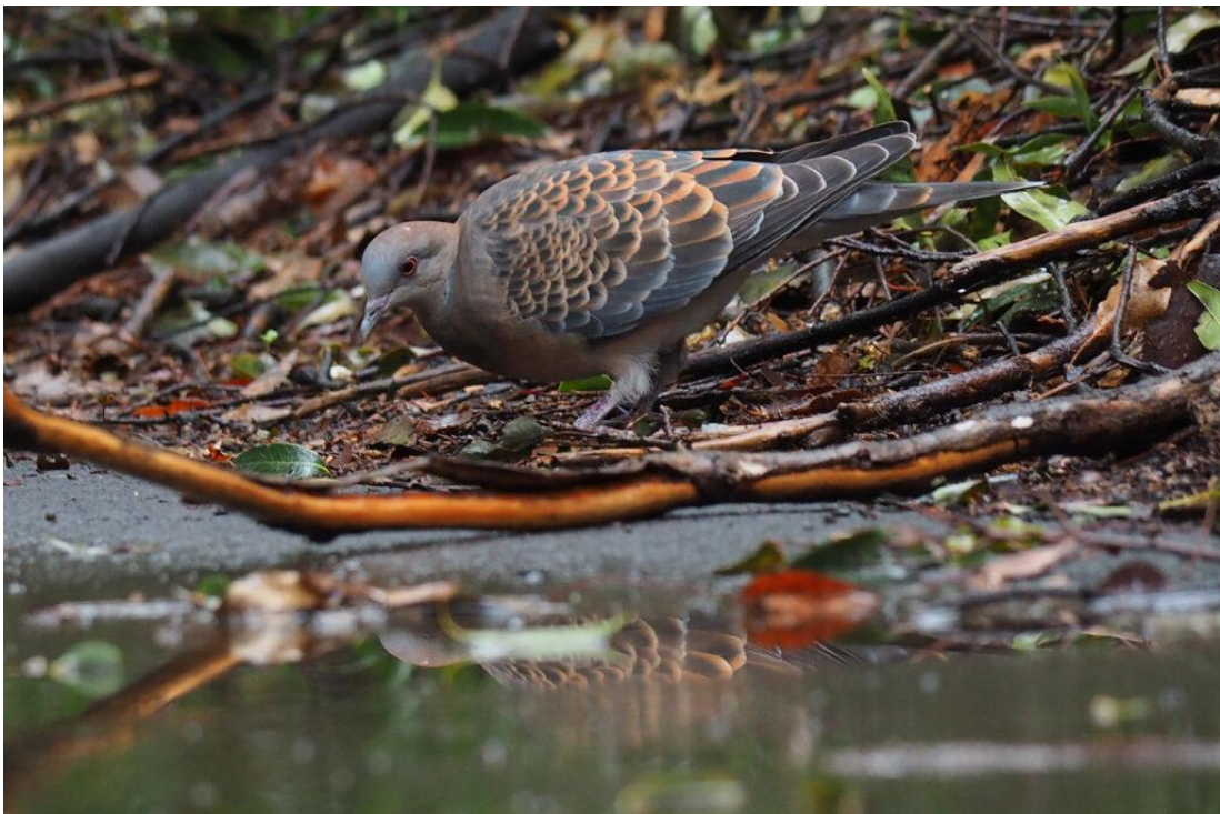
Oriental Turtle Dove