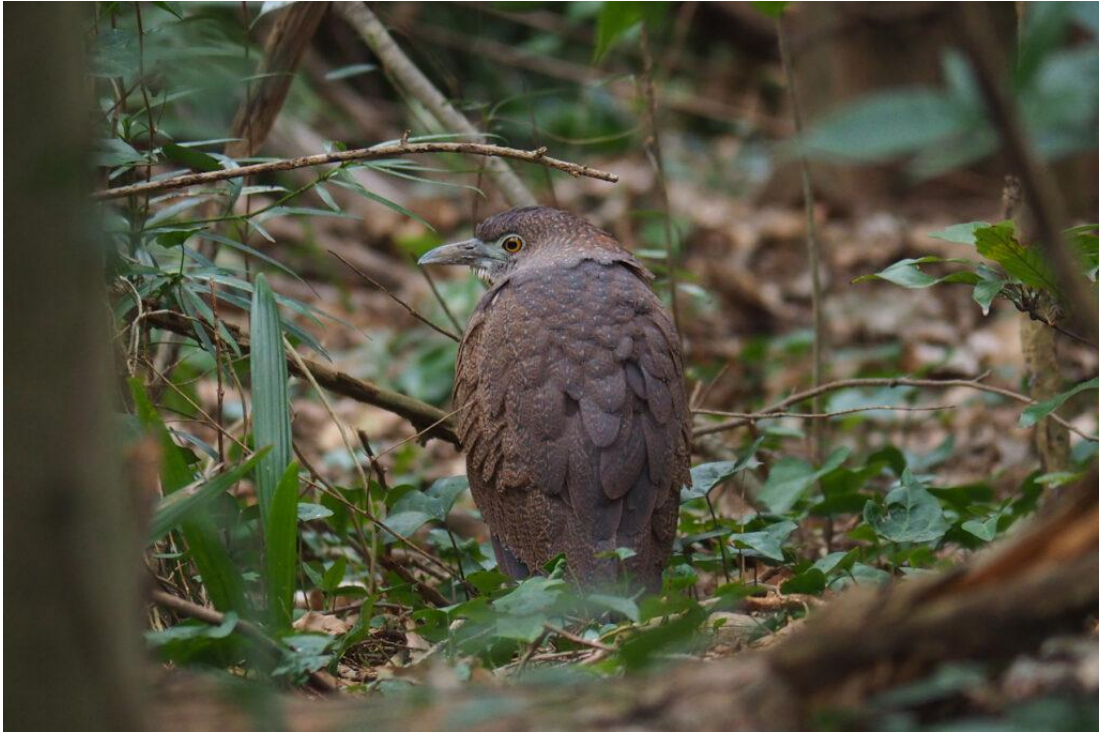
Japanese Night Heron