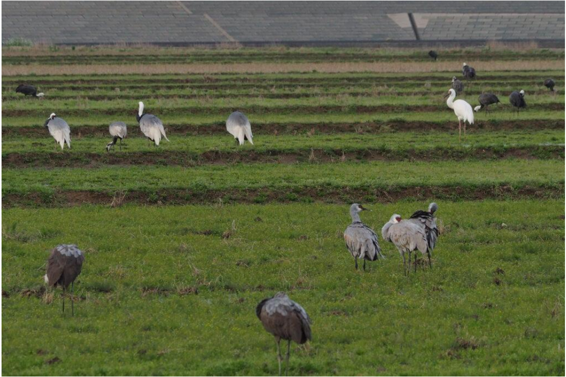
Four species of crane in one field!