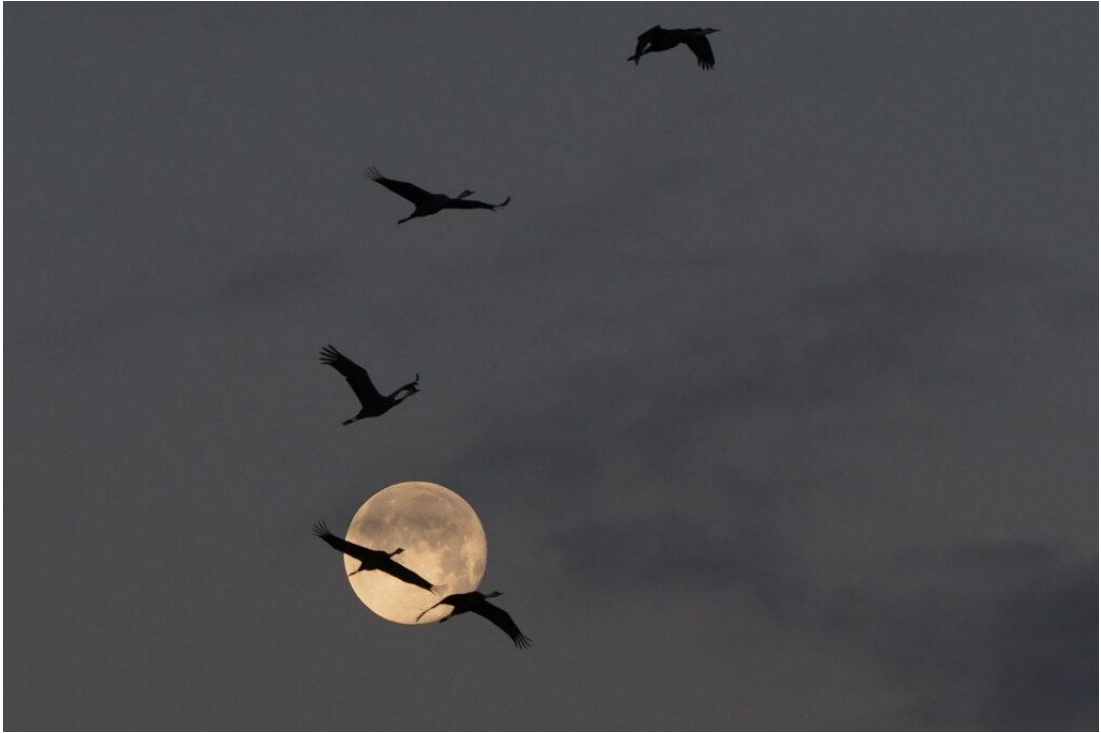
Hooded Cranes in the moonlight sky