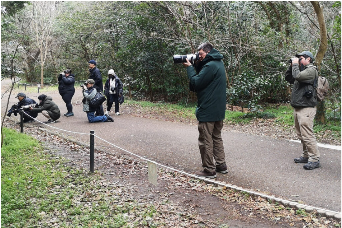
Japanese Night Heron twitch