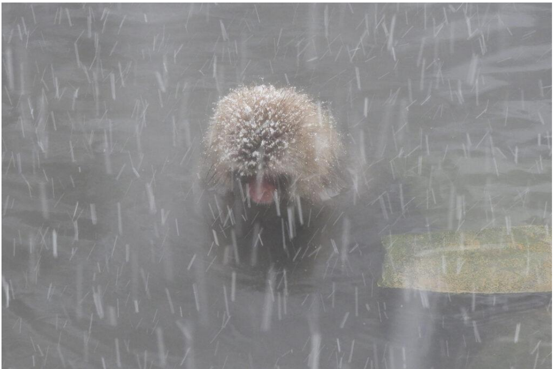
Japanese Macaques