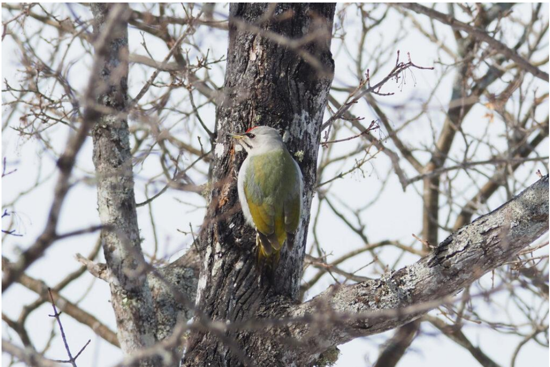
Grey-headed Woodpecker