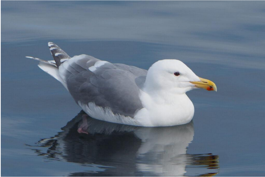
Glaucous-winged Gull