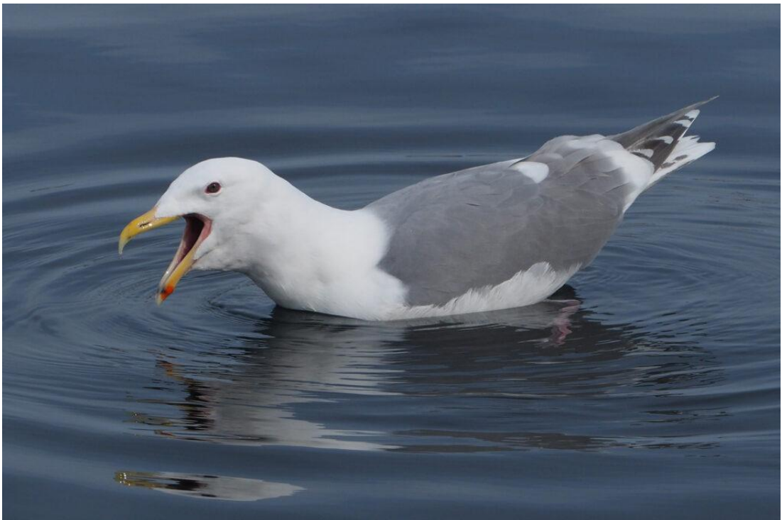
Glaucous-winged Gull