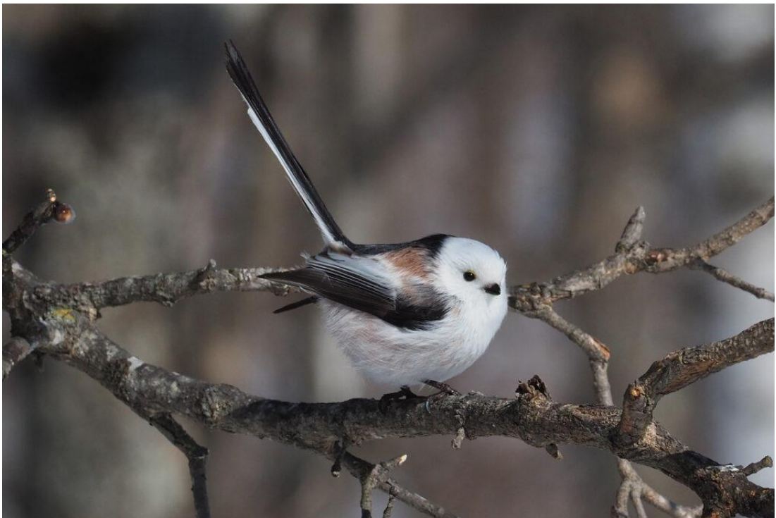
Long-tailed Tit