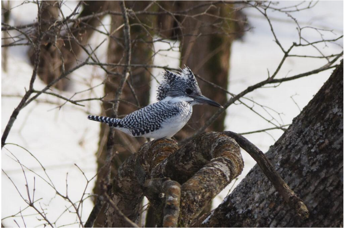
Crested Kingfisher