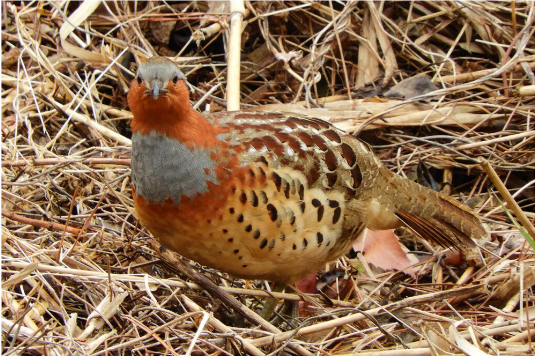
Chinese Bamboo Partridge