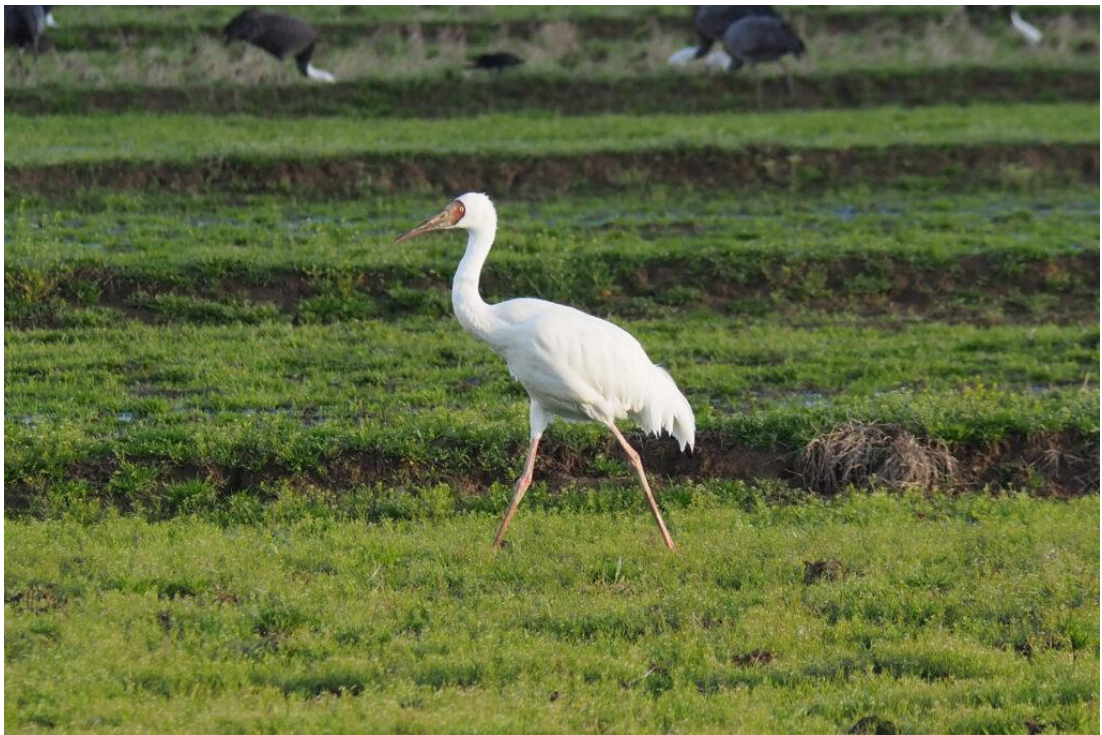
Siberian Crane