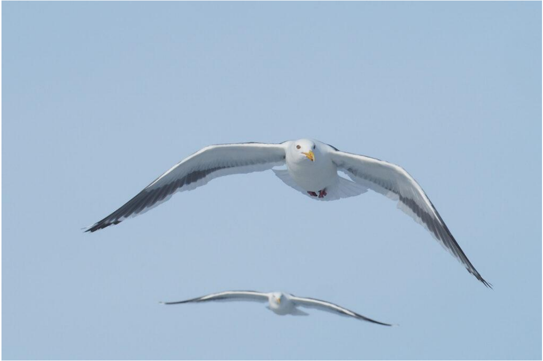
Slaty-backed Gulls