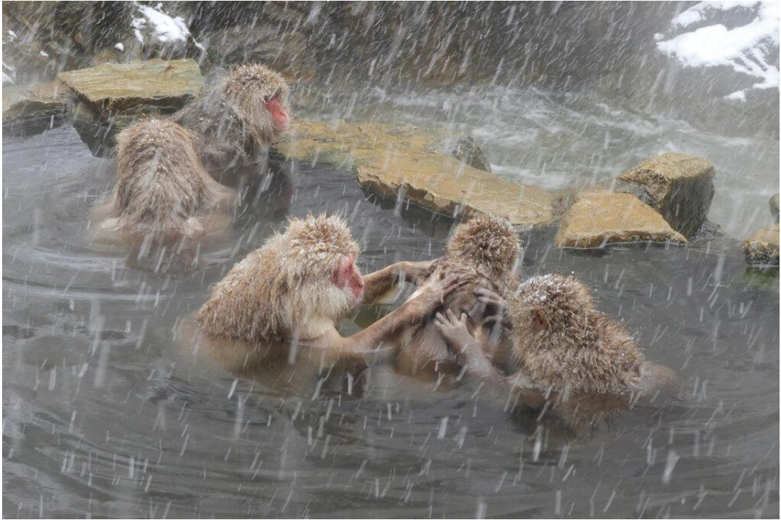
Japanese Macaques