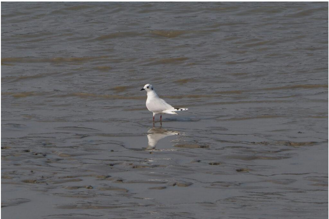
Saunders's Gull