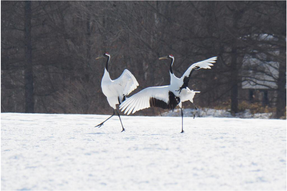
Red-crowned Cranes