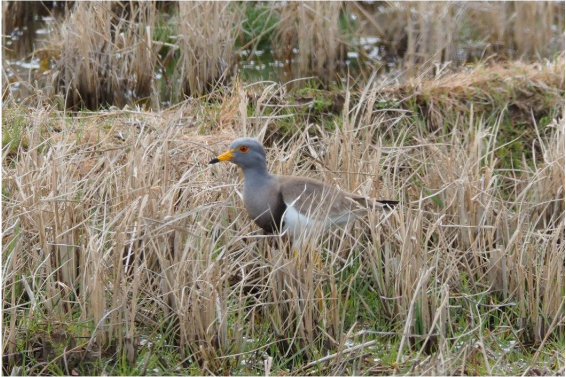
Grey-headed Lapwing