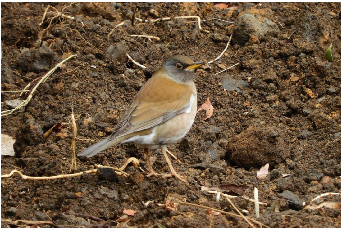
Pale Thrush