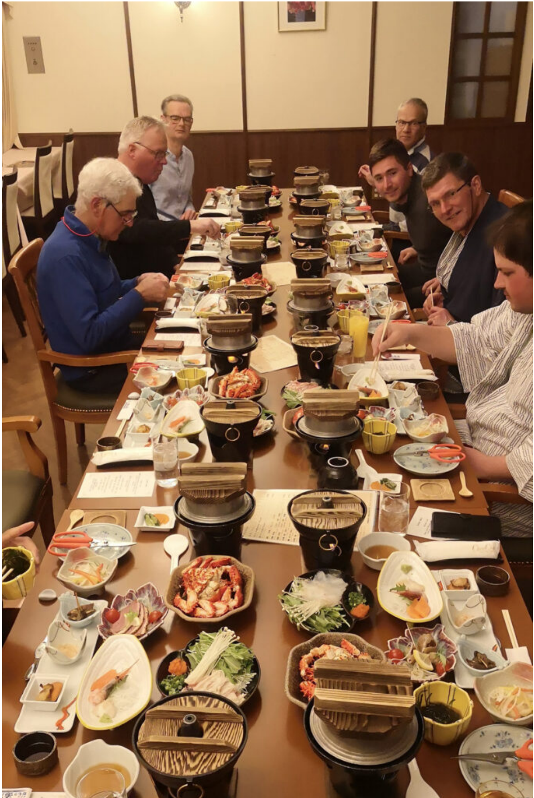
Dinner time!