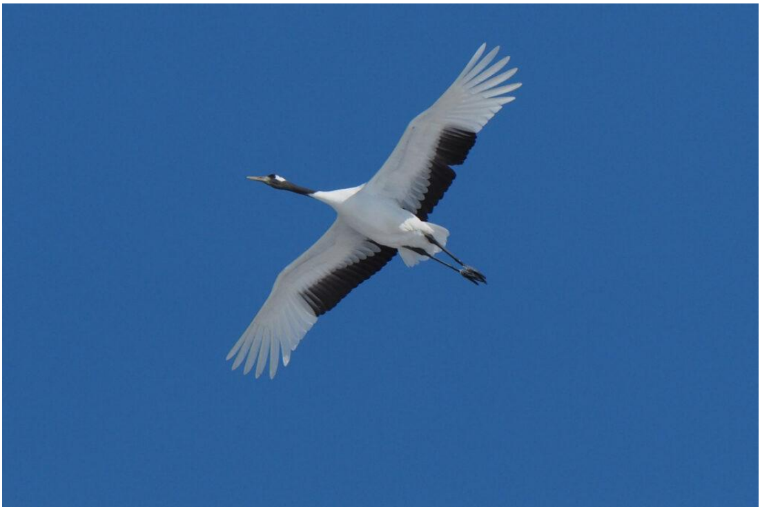
Red-crowned Cranes