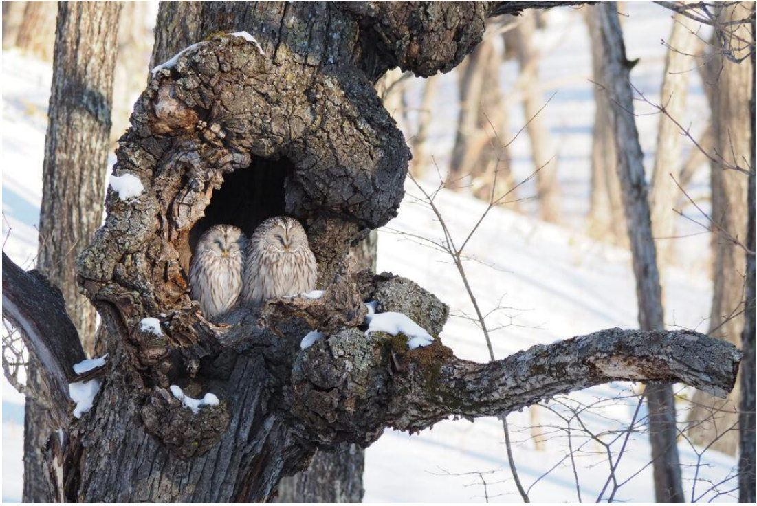
Ural Owls