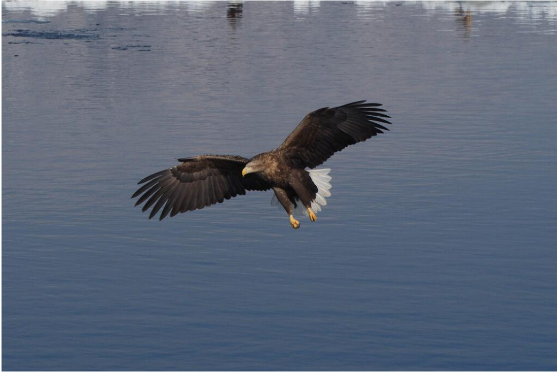
White-tailed Eagle