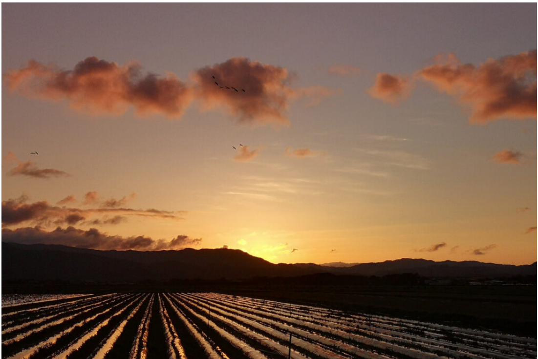
Arasaki at dawn