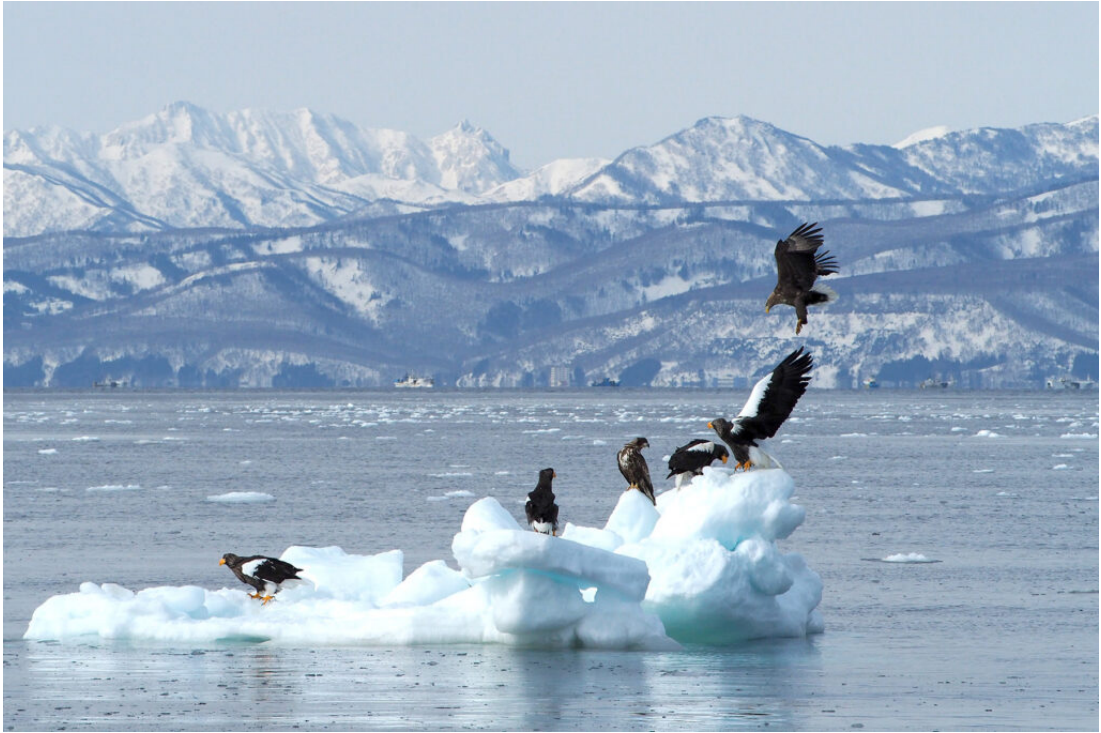
Eagles on an ice raft