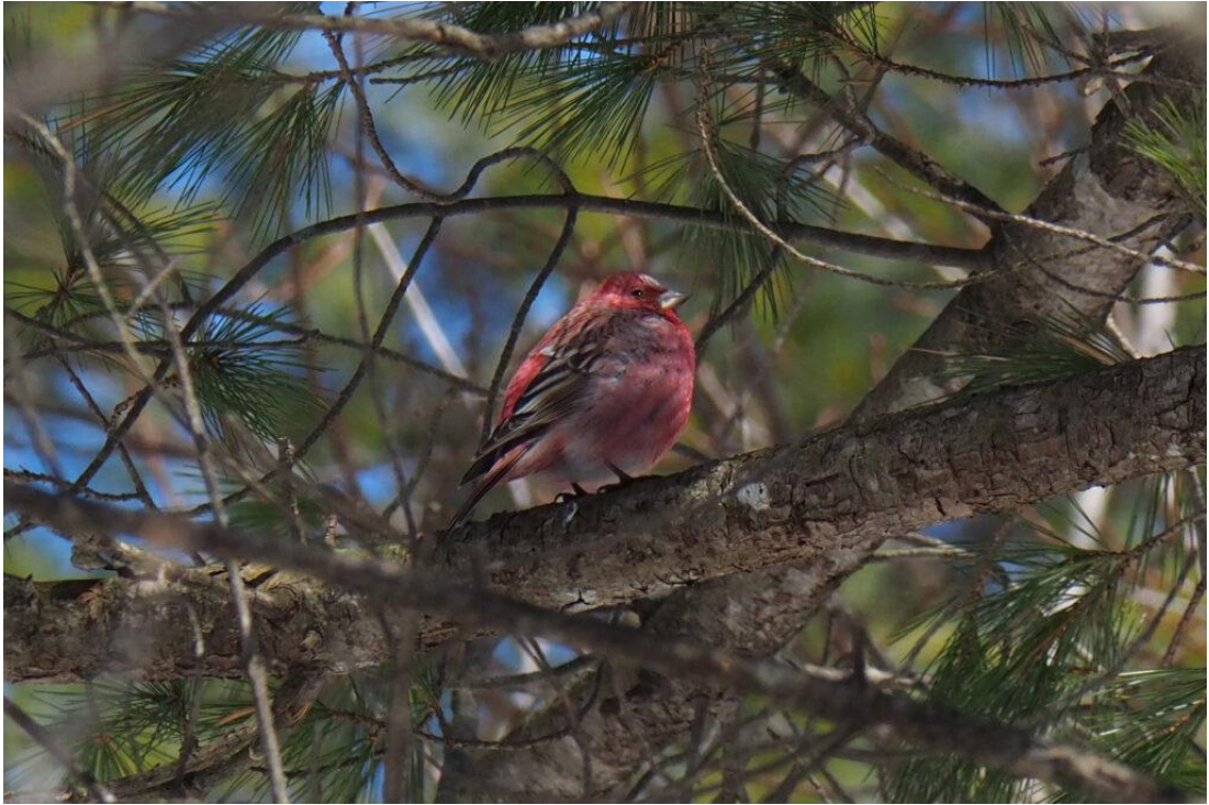
Pallas's Rosefinch