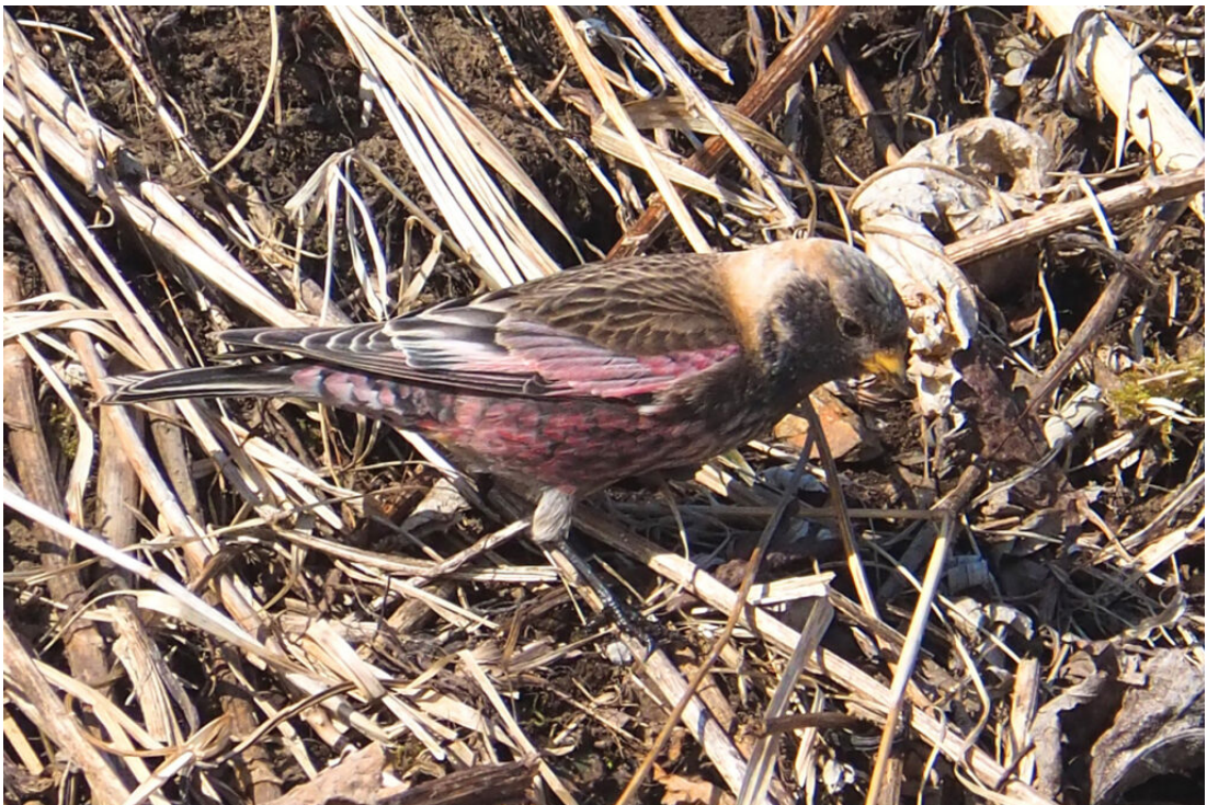
Asian Rosy Finch