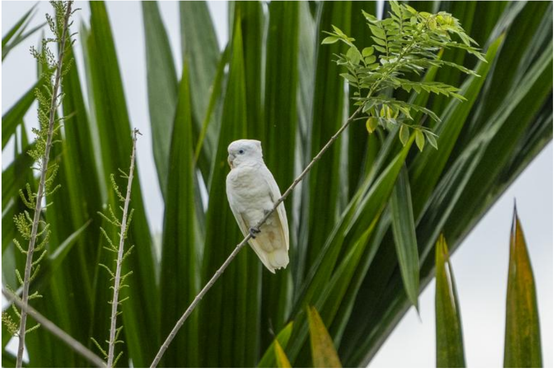
Solomons Cockatoo