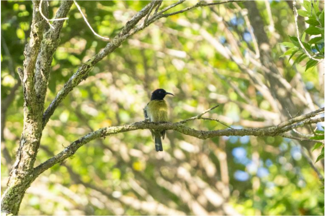
Red-capped Myzomela