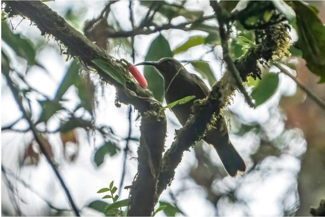
We were the first-ever birders to see Gilliard's (or New Britain) Honeyeater