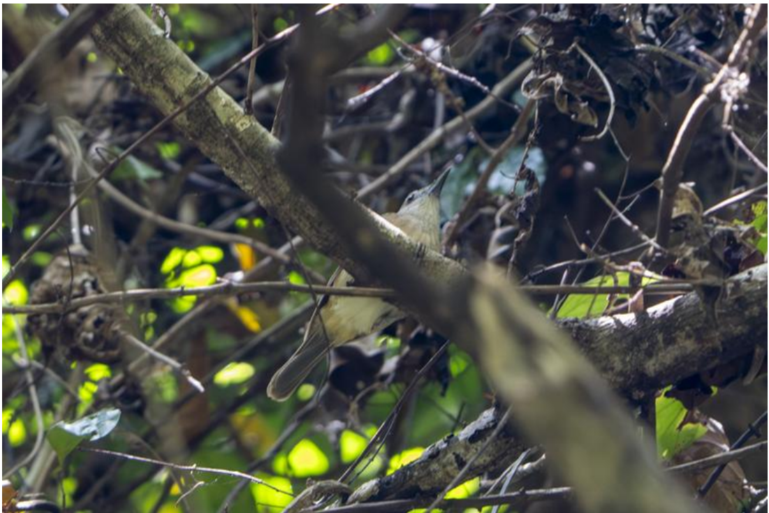
Tagula Shrikethrush