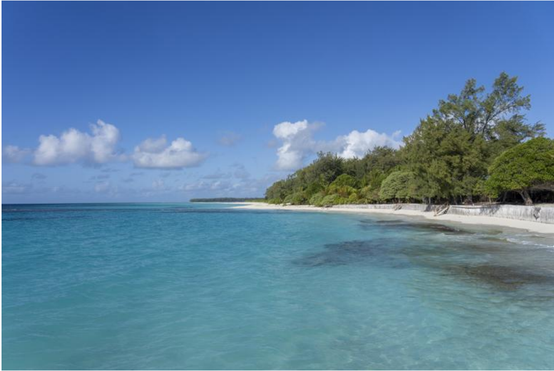
Many of the Louisiade Islands are still an unspoiled paradise