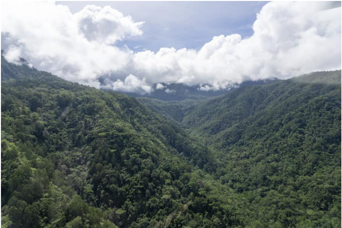
The Nakanai Range from the air