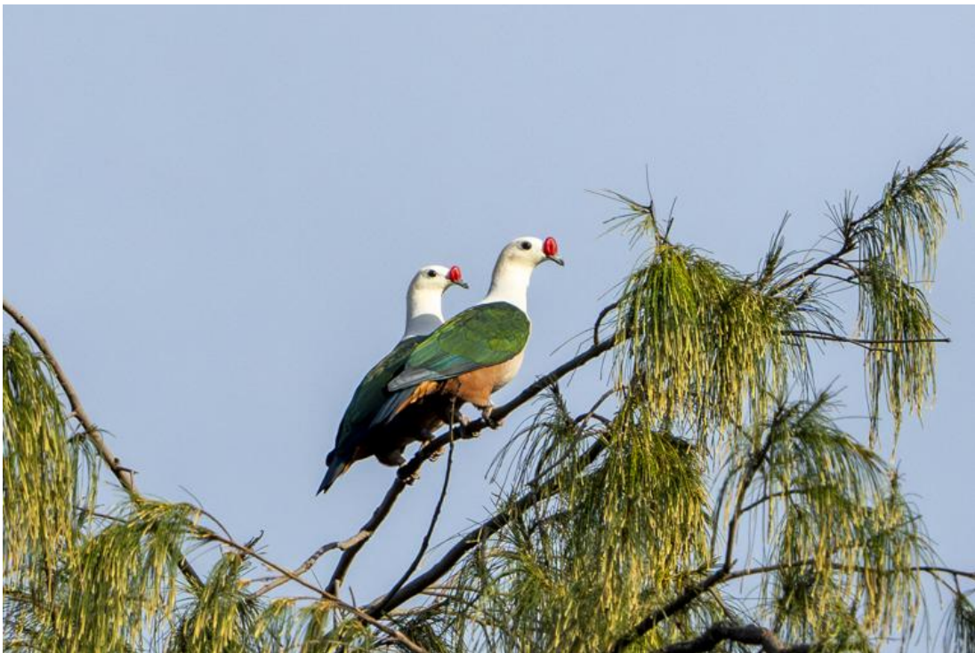
Red-knobbed Imperial Pigeons