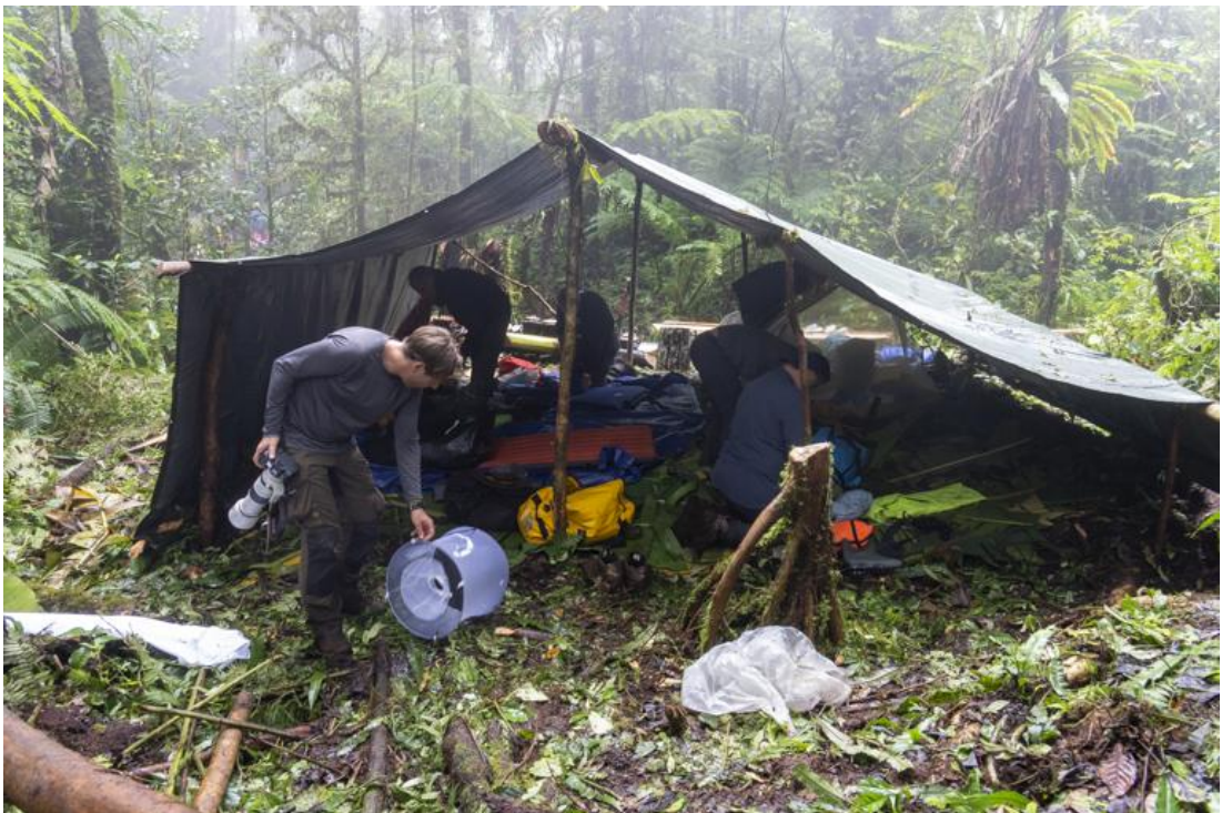
Our camp in the highlands of Bougainville