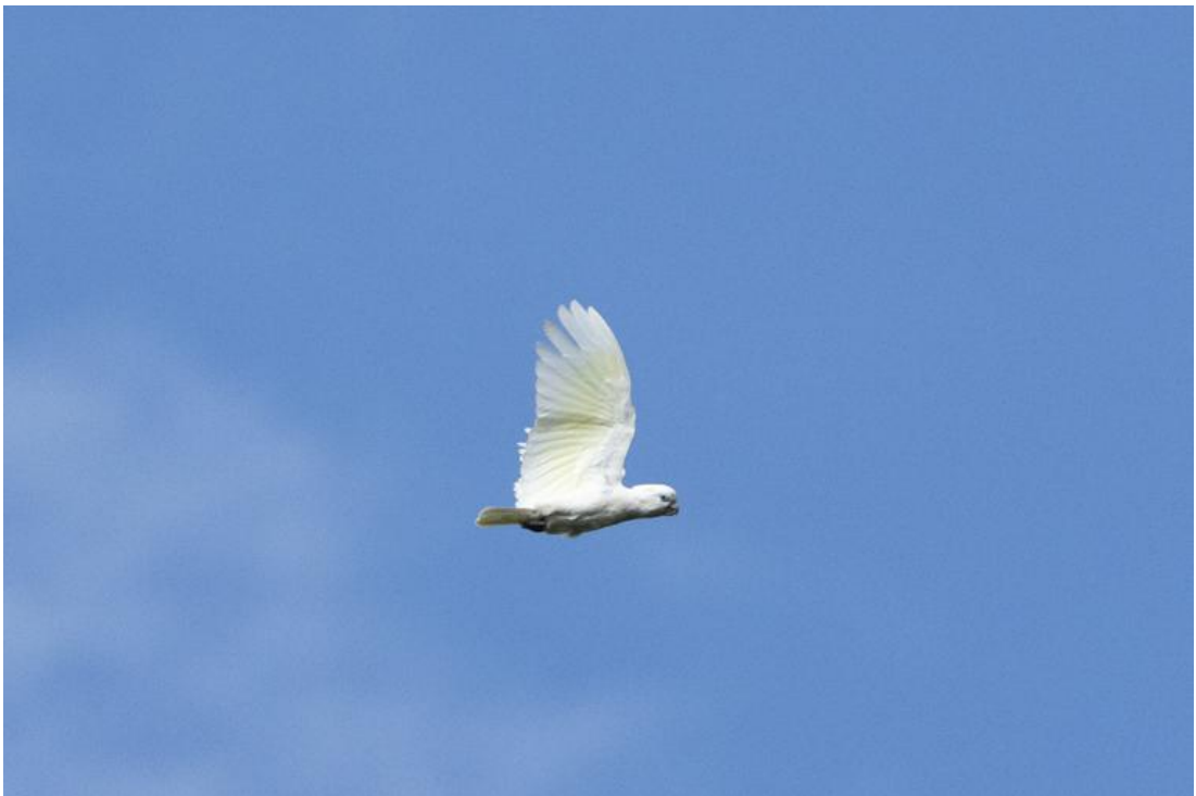
Solomons Cockatoo