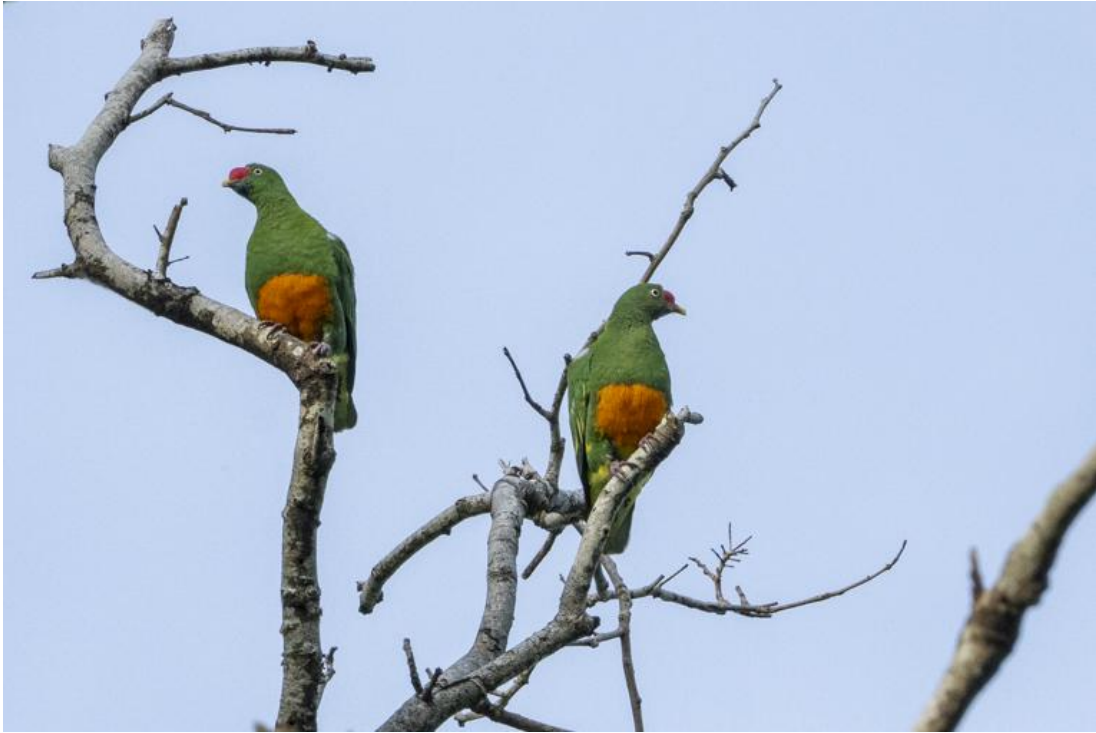
Knob-billed Fruit Doves