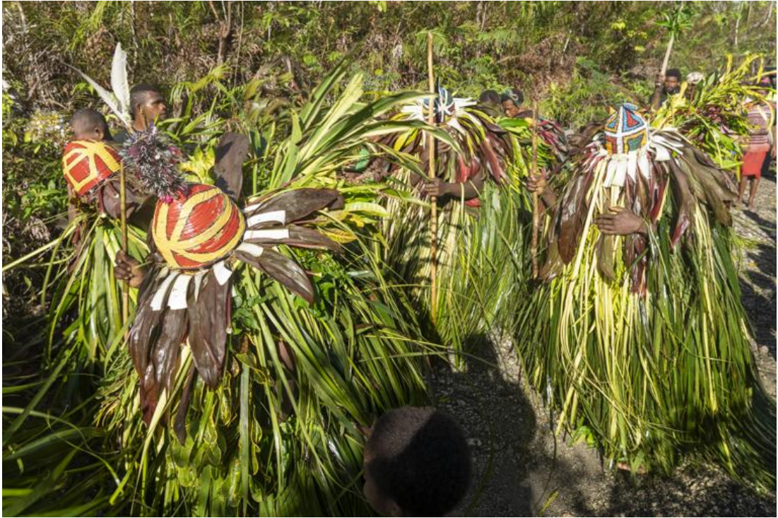
Dancing for us at the foot of the Nakanai Range