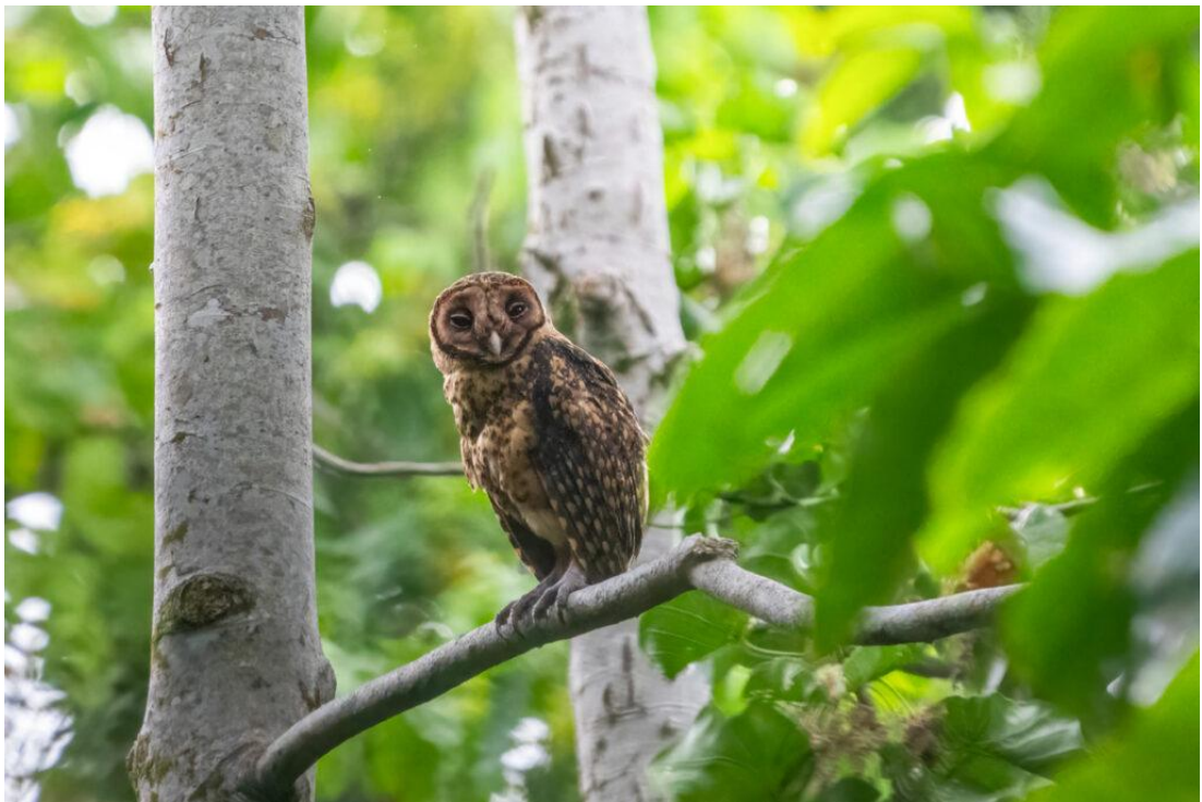
Golden Masked Owl