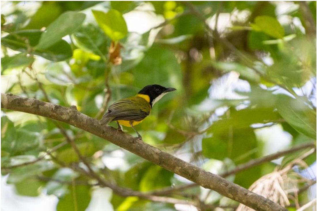
Louisiade Whistler