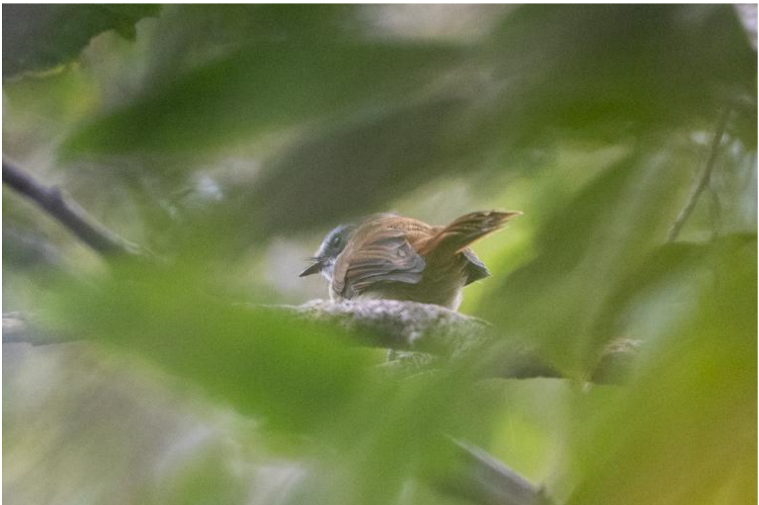
Bismarck Fantail in the Nakanai