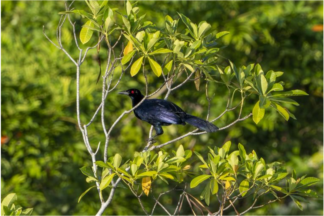
Tagula Manucode