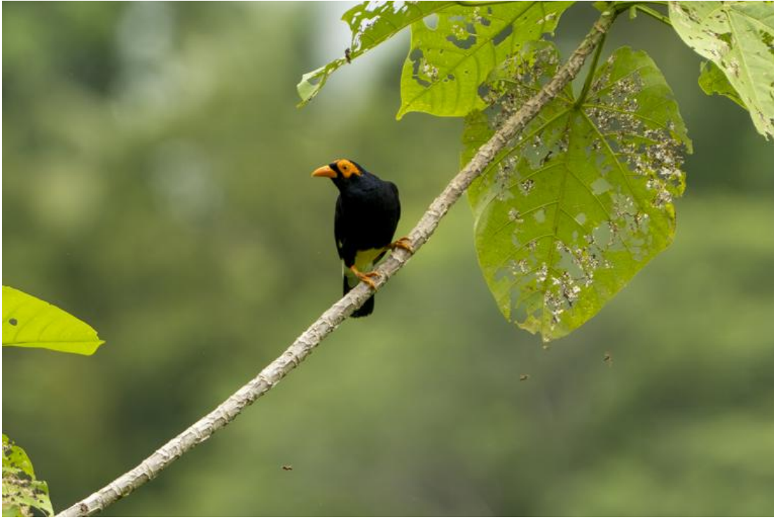
Long-tailed Myna