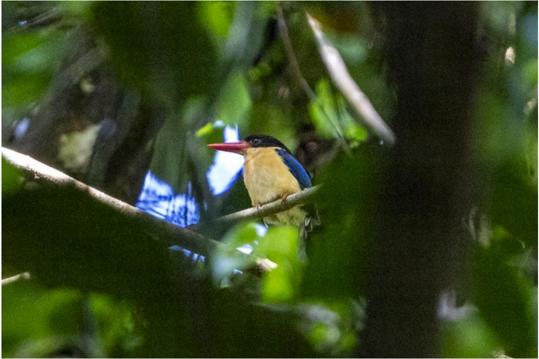
Black-capped Paradise Kingfisher