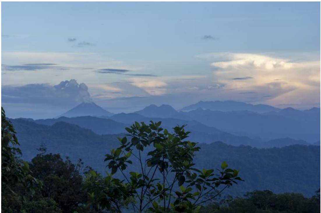
The southern highlands of Bougainville (image by Mark Beaman)