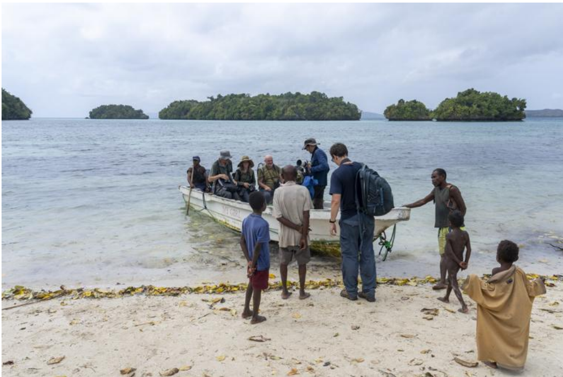
The end of a landing in the Louisiades