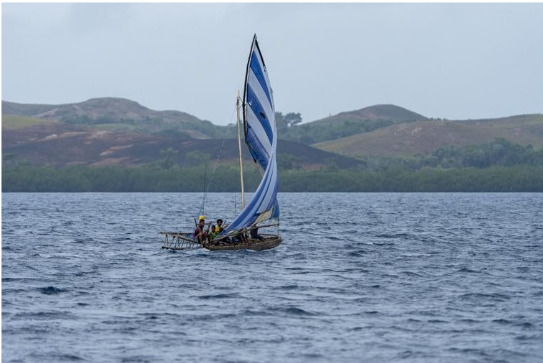
Louisiane boat people