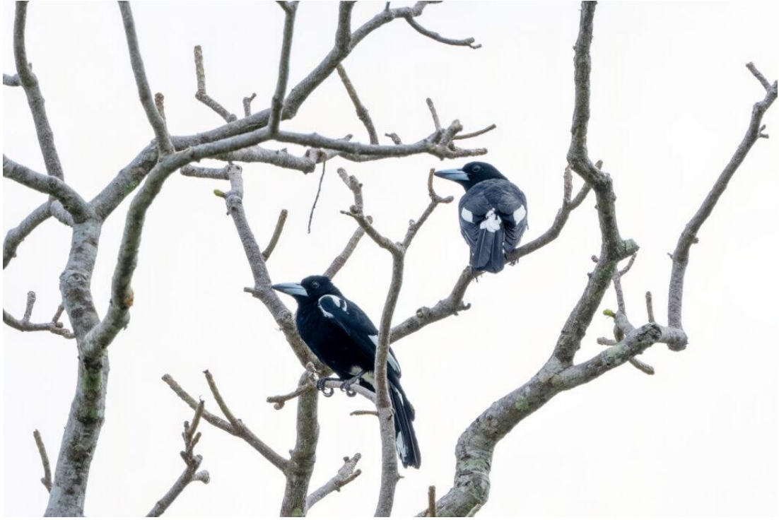
Tagula Butcherbirds