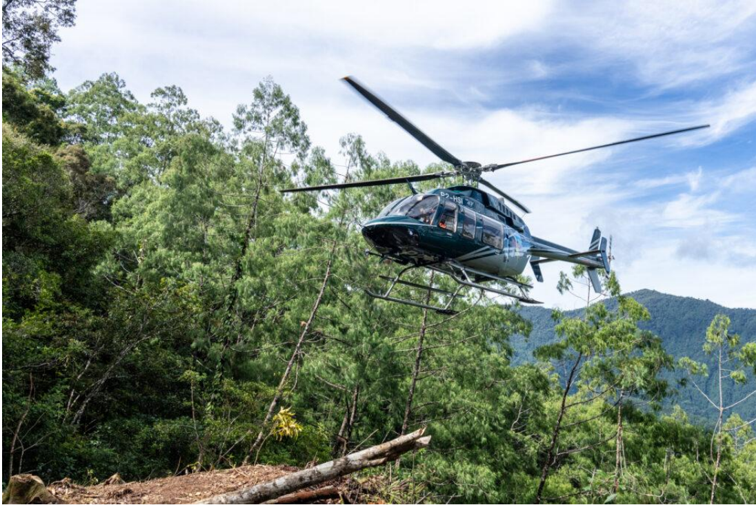
Landing on a pile of logs on a knife-edge ridge in the Nakanai, New Britain

Solomons Naked-backed Fruit Bat Dobsonia inermis A few on Bougainville. Solomons endemic.