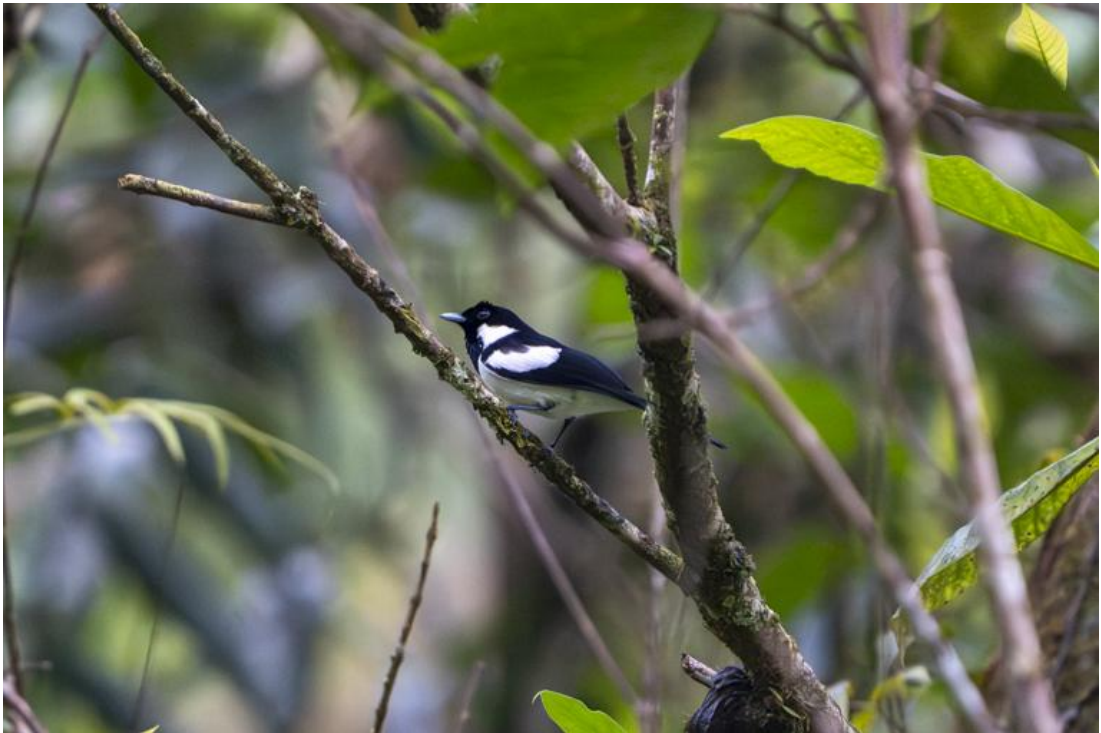
Solomons Monarch