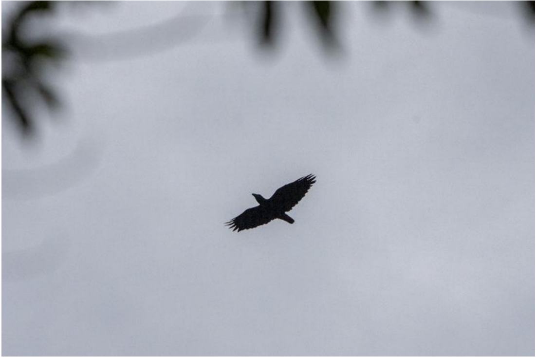
Bougainville Crow