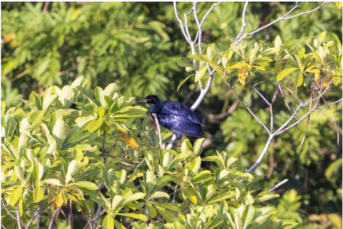
Tagula Manucode