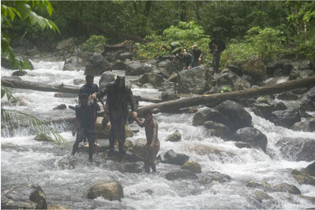
Even after getting down the Nakanai, we still needed our fantastic guides' and porters' help