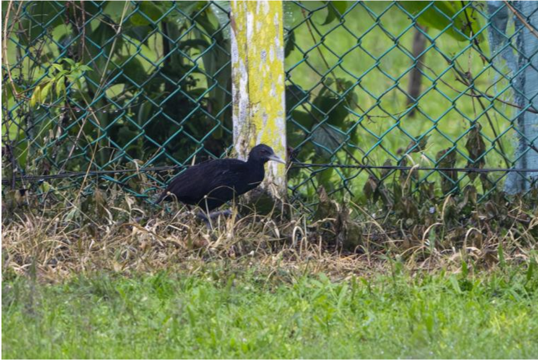
Woodford's Rail of the Bougainville form tertius