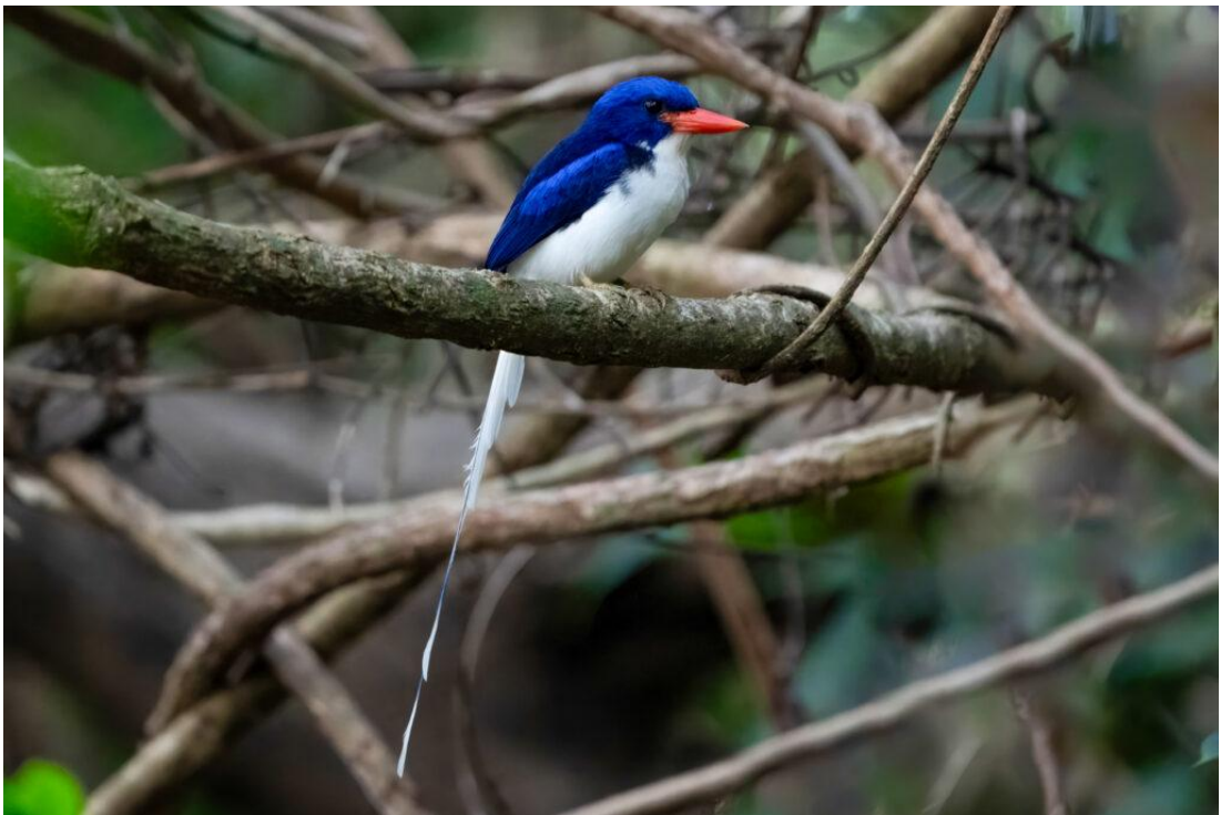
Rossel Paradise Kingfisher