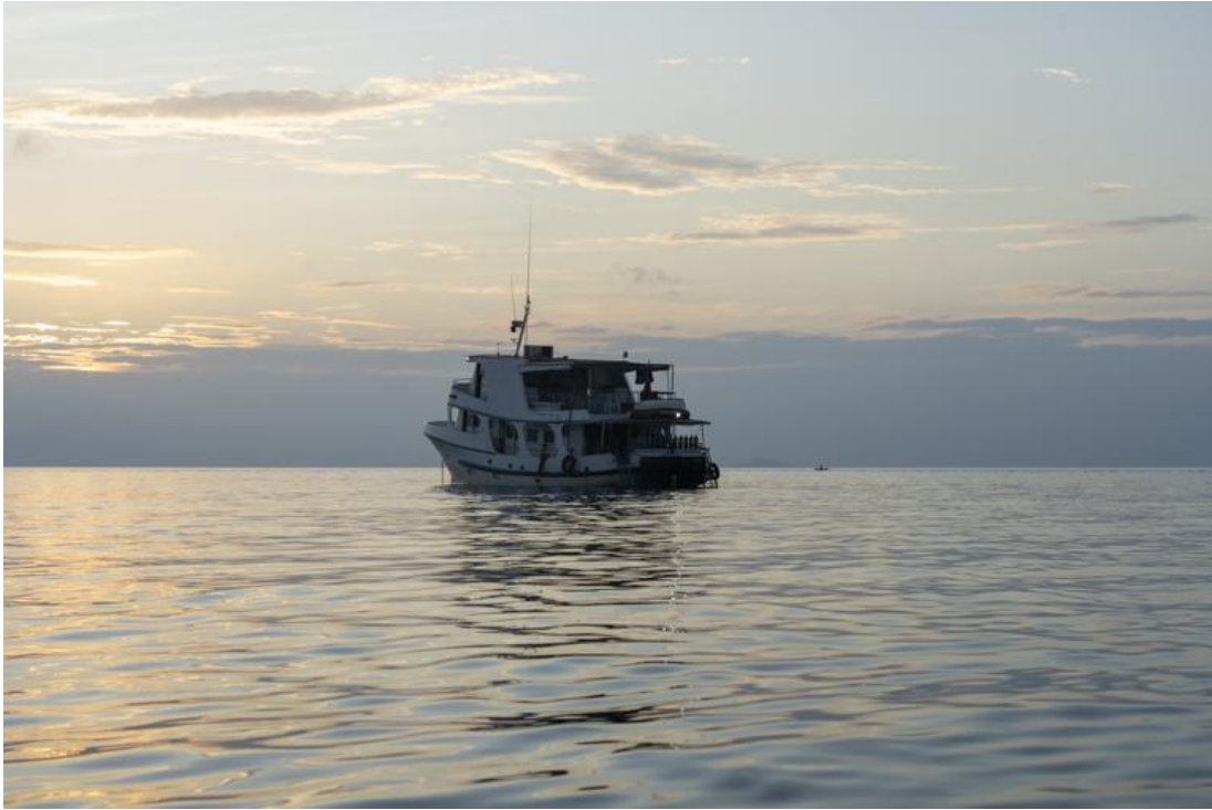
Birdquest's liveaboard boat in the Louisiade Islands