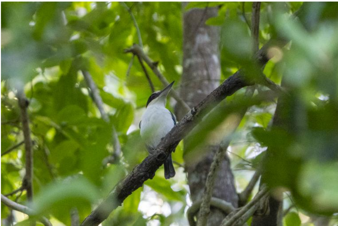
Islet (or Colonist) Kingfisher