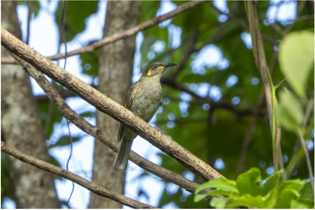
Tagula Honeyeater