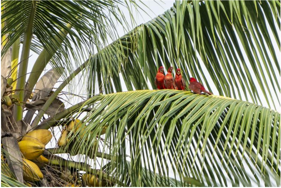
Cardinal Lories