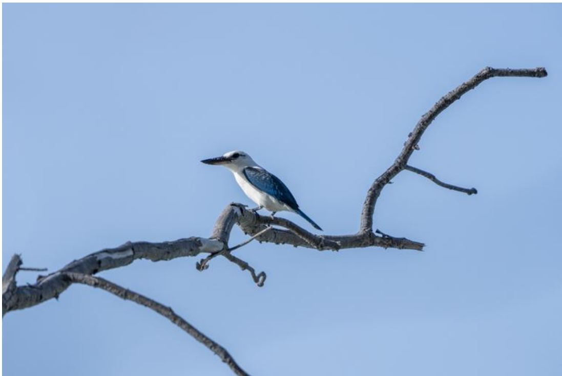
Beach Kingfisher