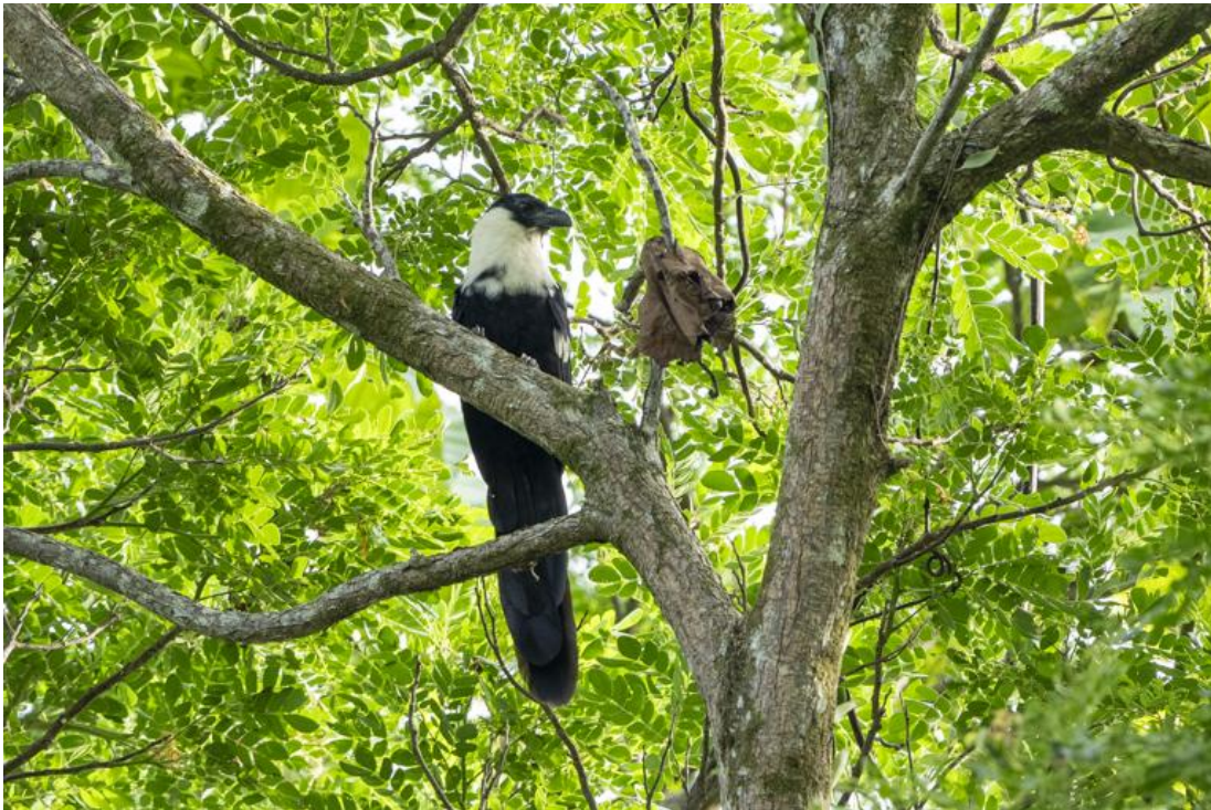
White-necked Coucal