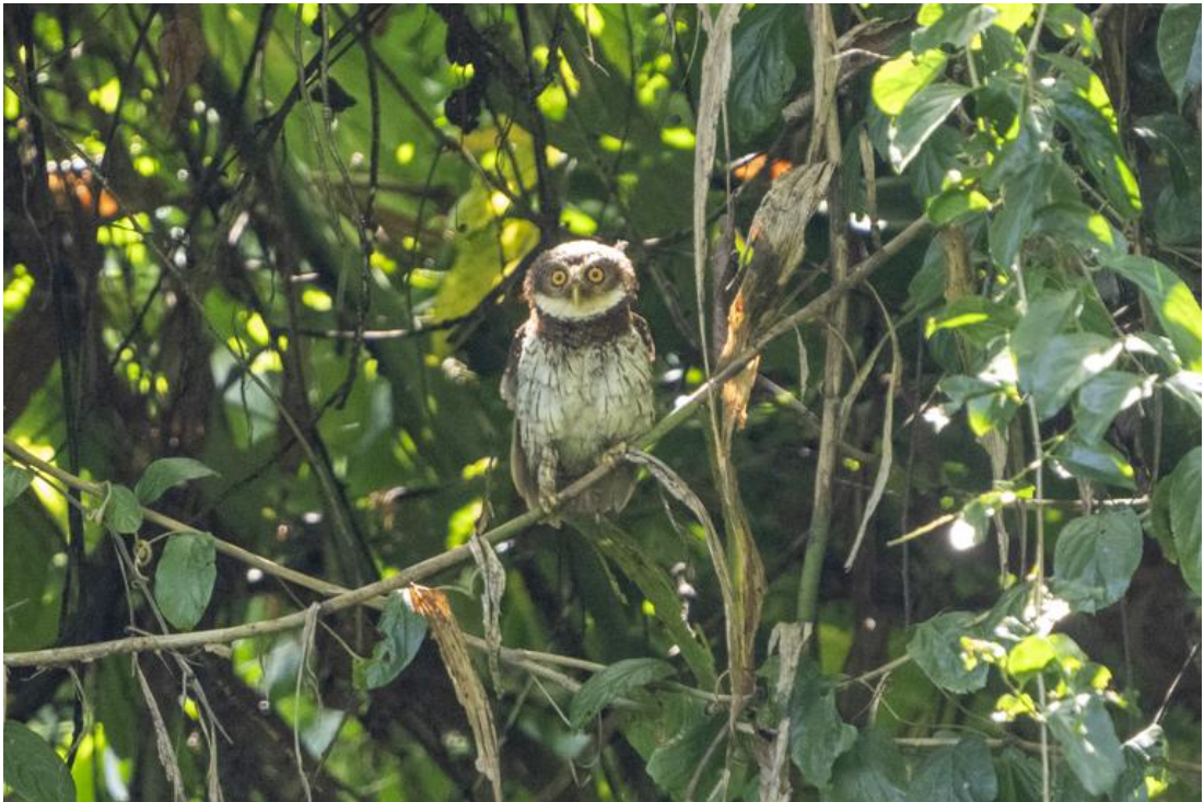
Papuan Boobook