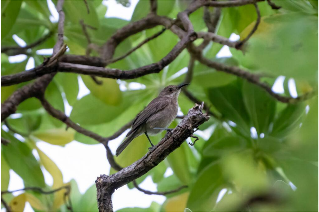
White-chinned Myzomela