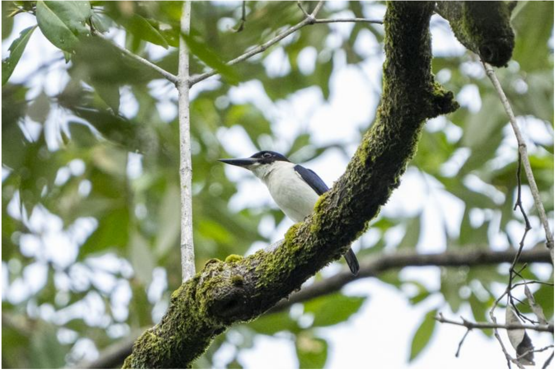
Ultramarine Kingfisher