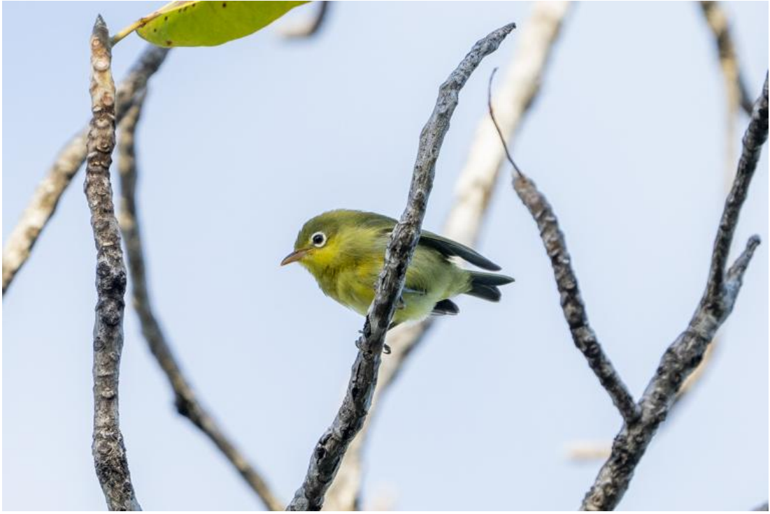
Louisiade White-eye