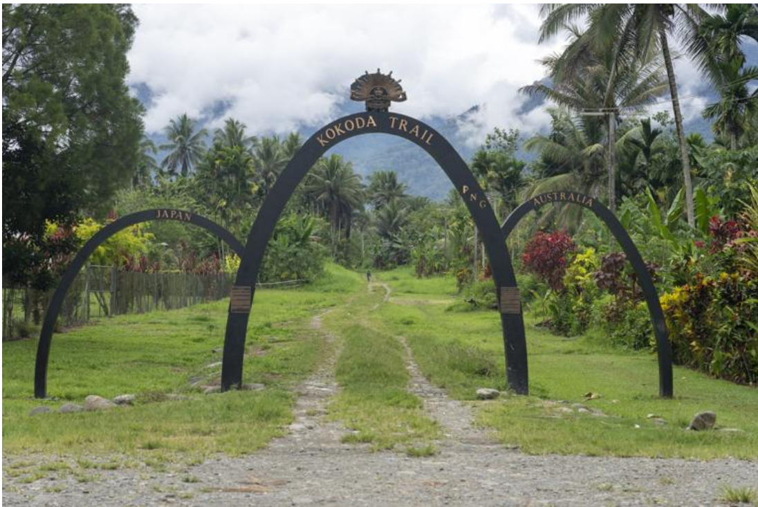
The start of the Kokoda Trail