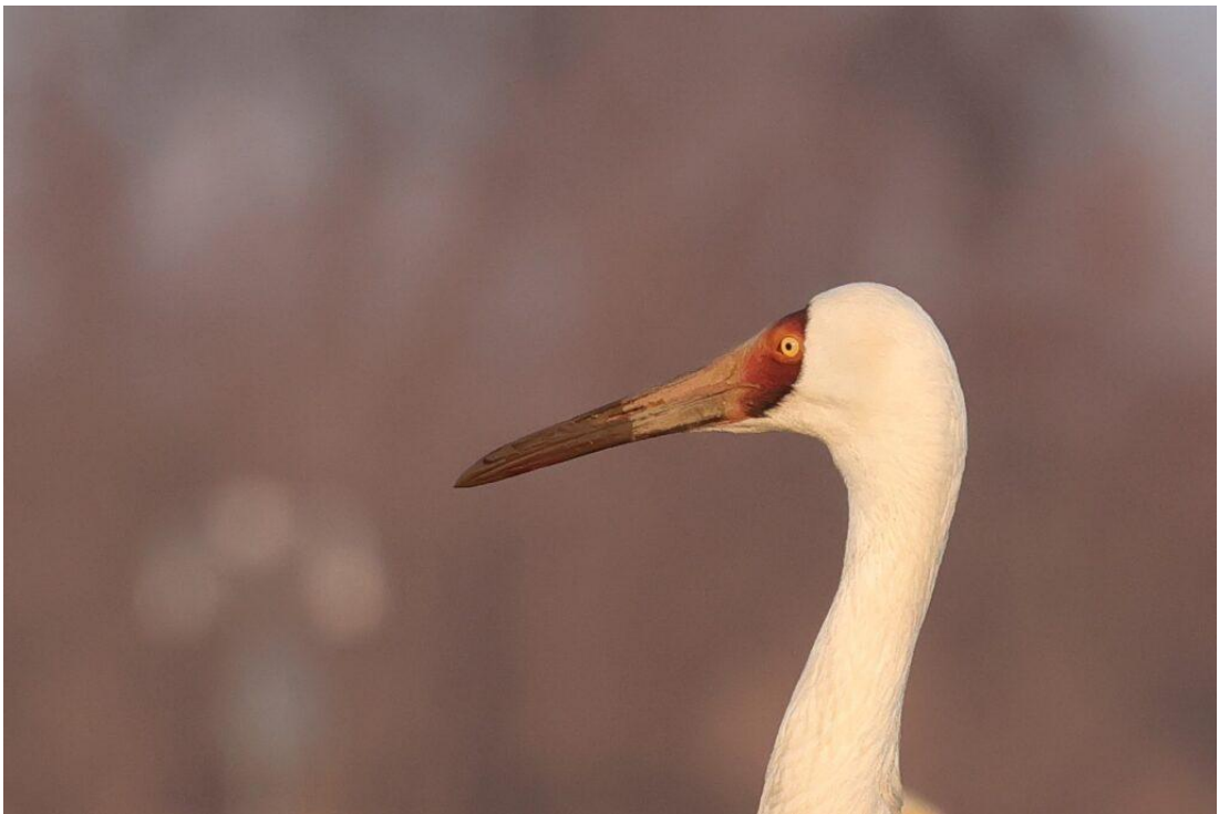
Siberian Crane