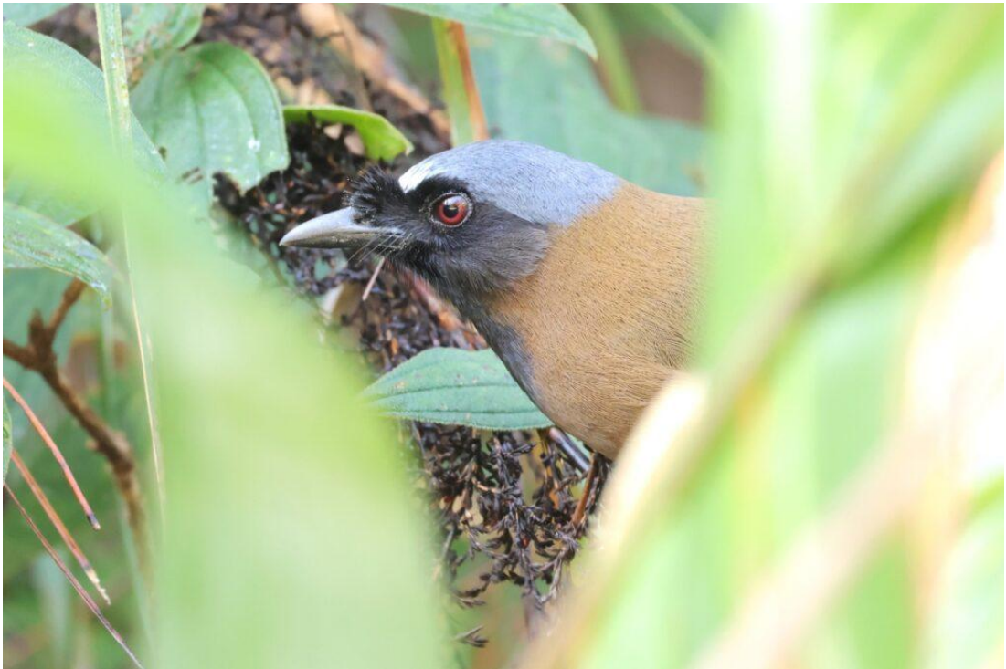
Hainan (Black-throated) Laughingthrush