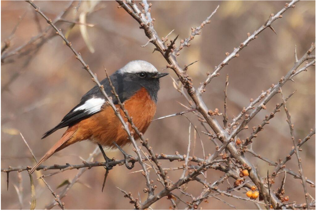
Golden-crowned Kinglet