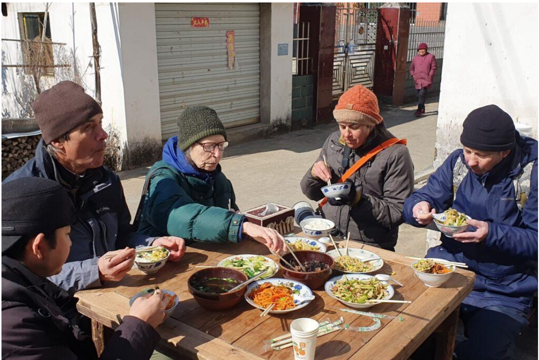
Lunch at Kengkou