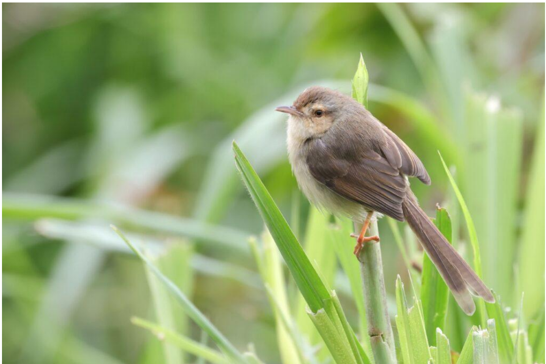
Plain Prinia