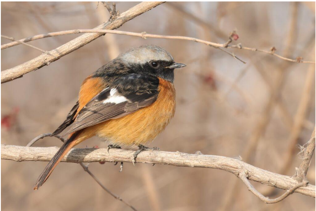
male Daurian Redstart