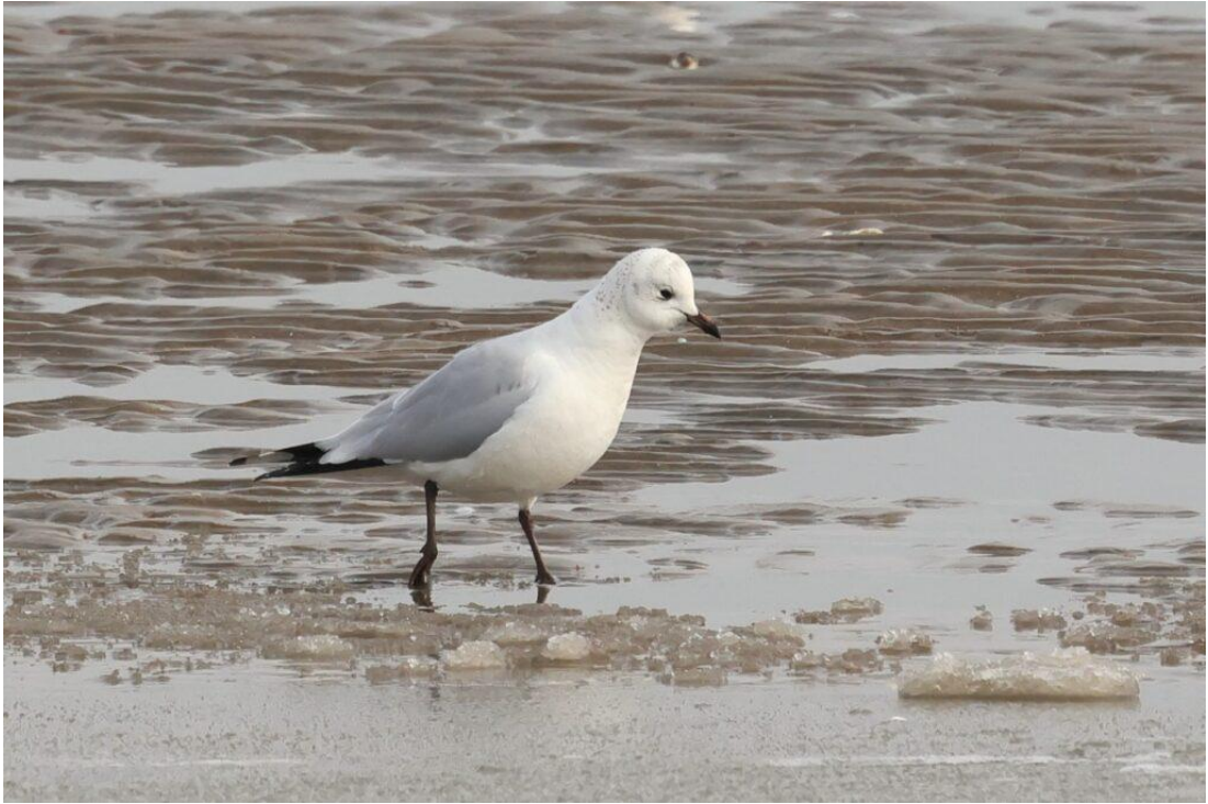
Relict Gull