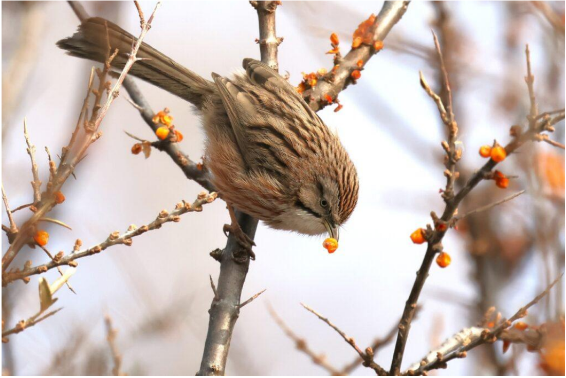
Beijing Babbler