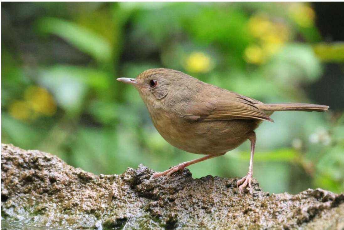
Buff-breasted Babbler