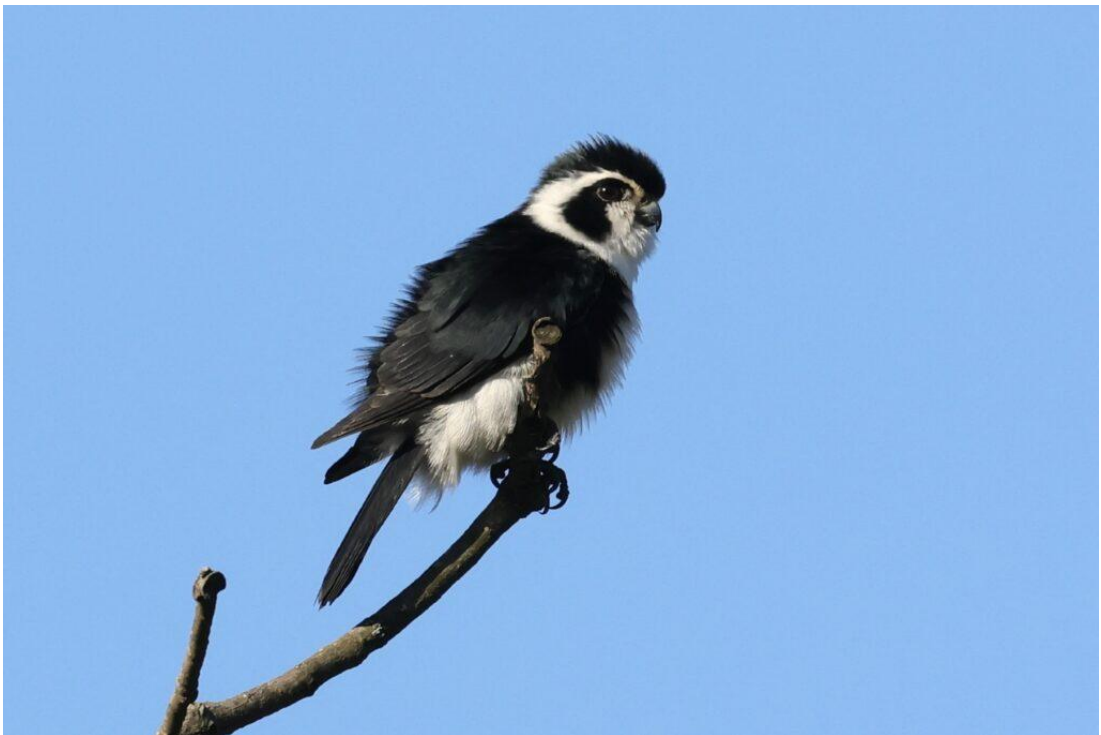
Red-footed Booby