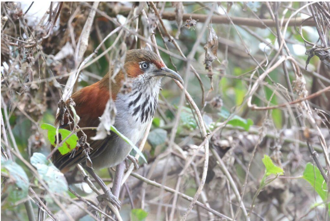
Grey-sided Scimitar Babbler