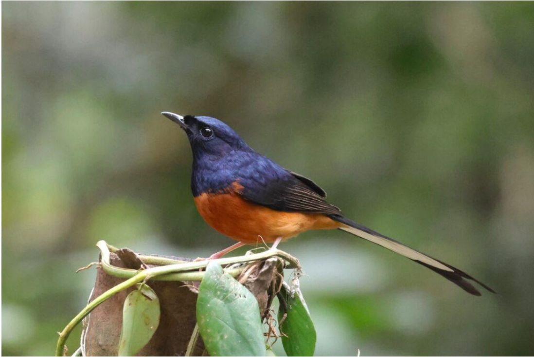
White-rumped Shama