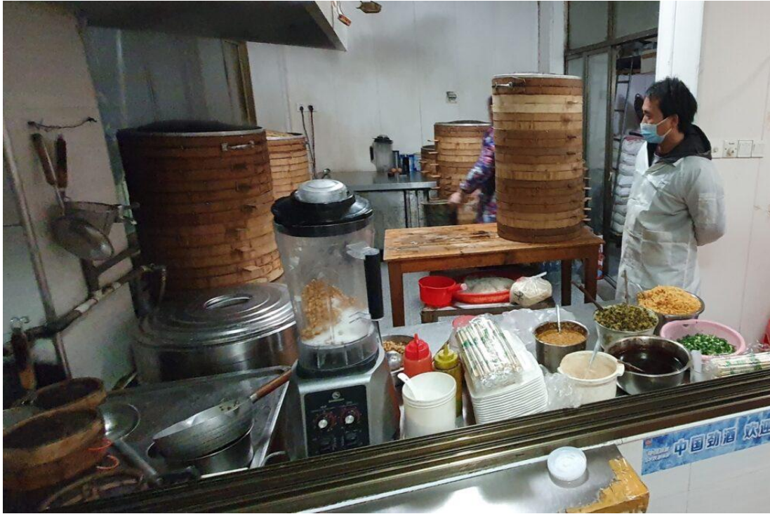
Breakfast in China!