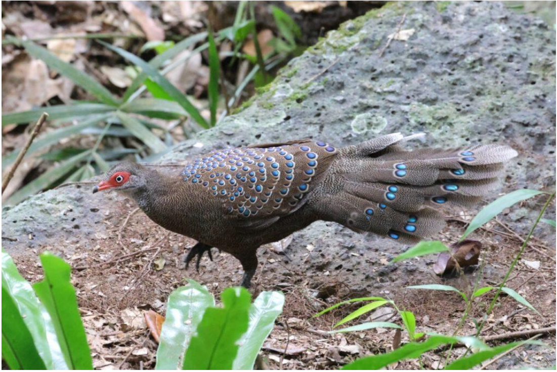
Hainan Peacock-Pheasant