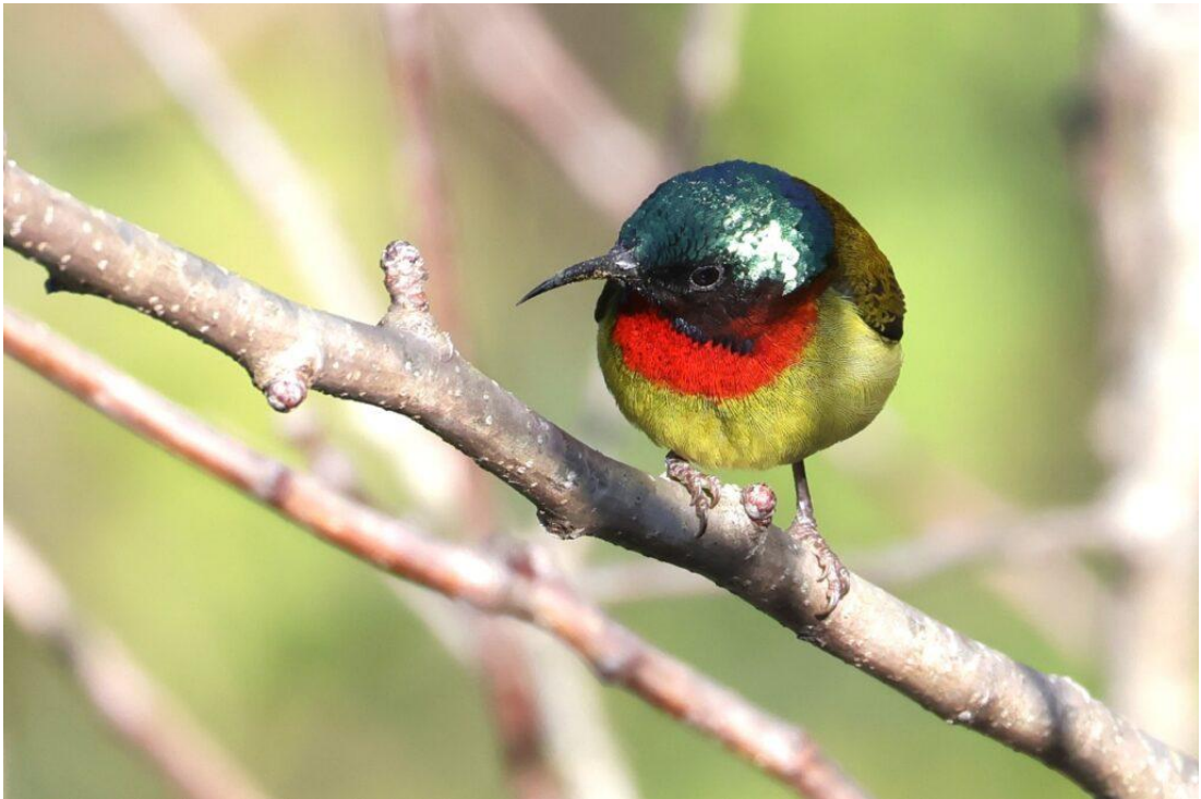
Fork-tailed Sunbird