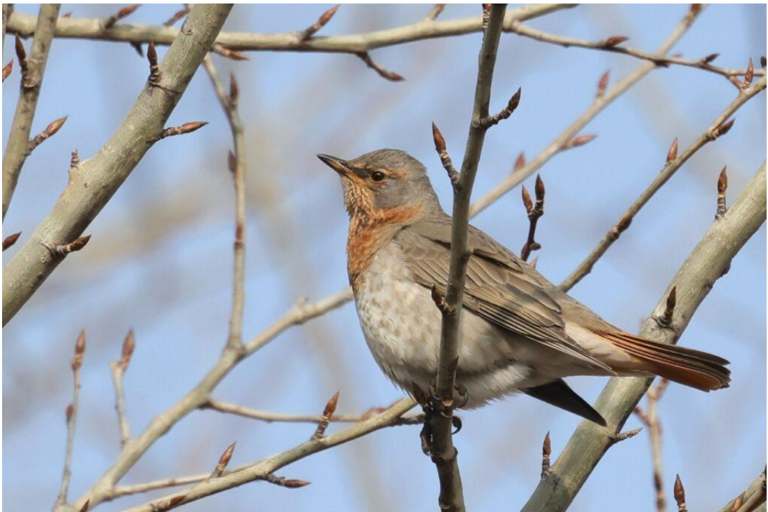
Red-throated Thrush