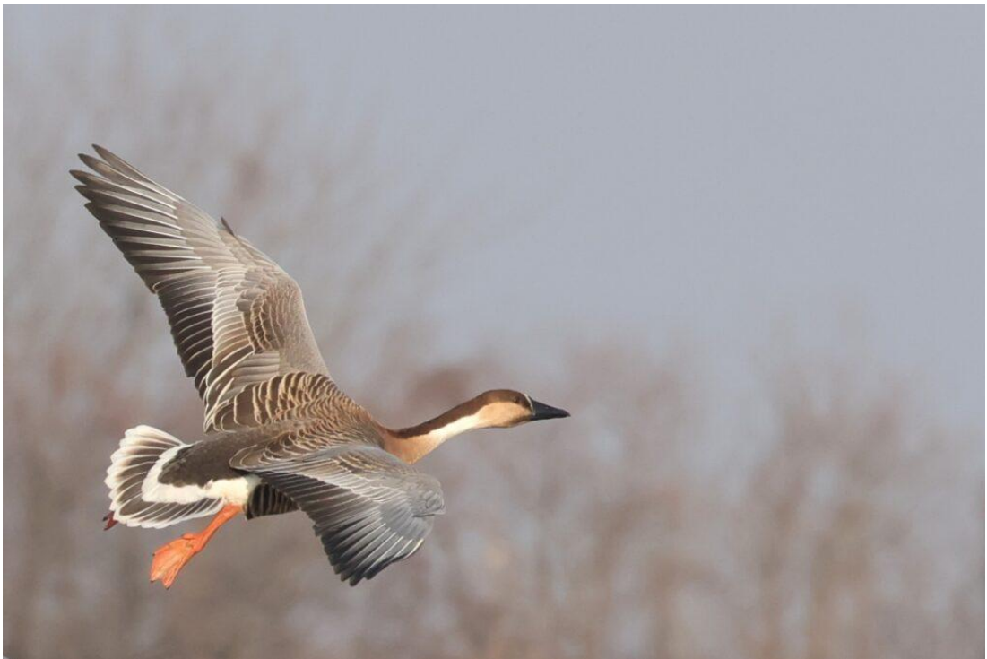
Swan Goose