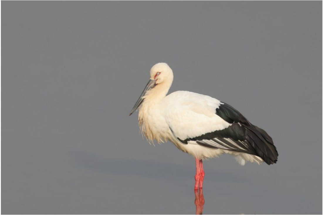
Oriental Stork