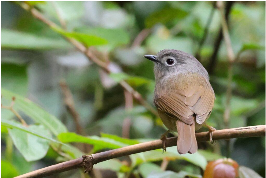
David's Fulvetta