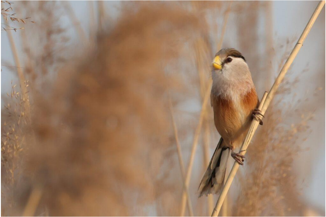
Reed Parrotbill