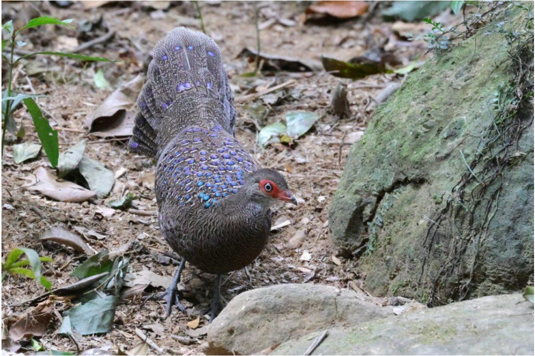
Hainan Peacock-Pheasant