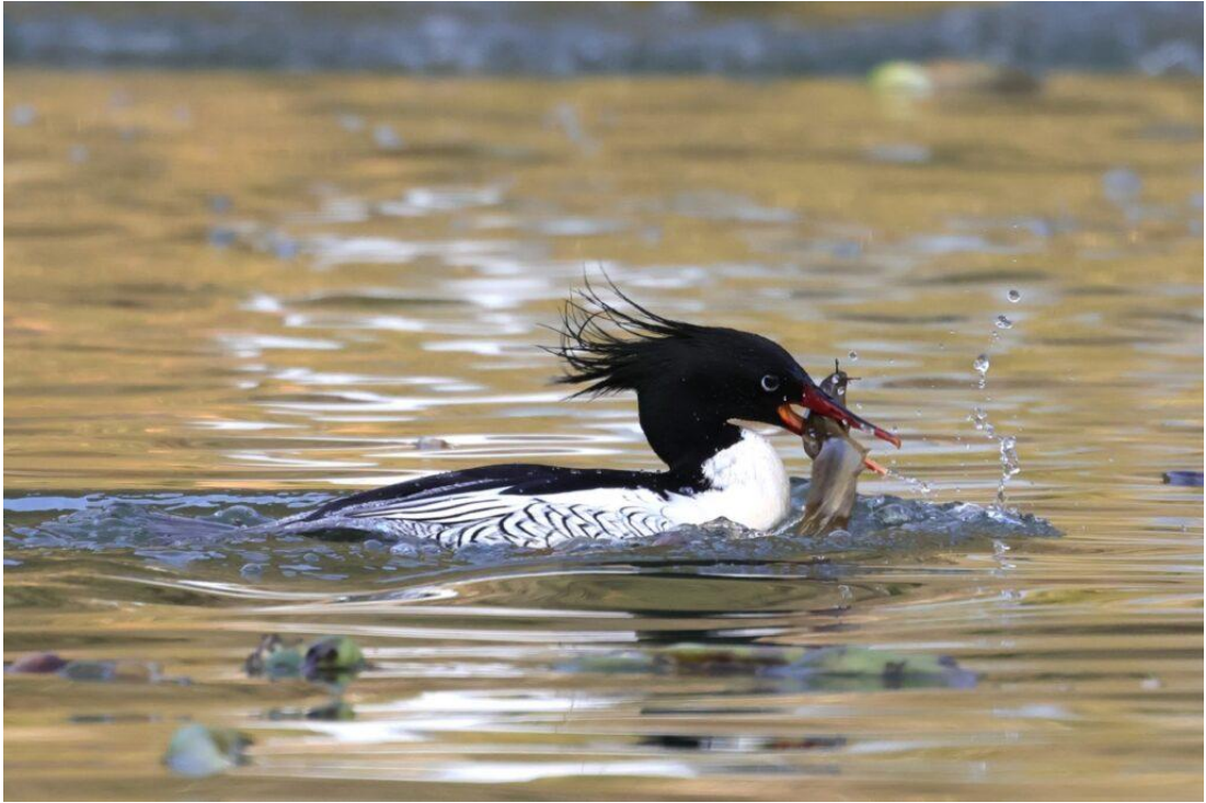
male Scaly-sided Merganser