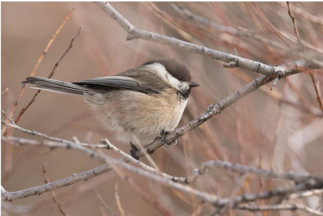
Willow Tit