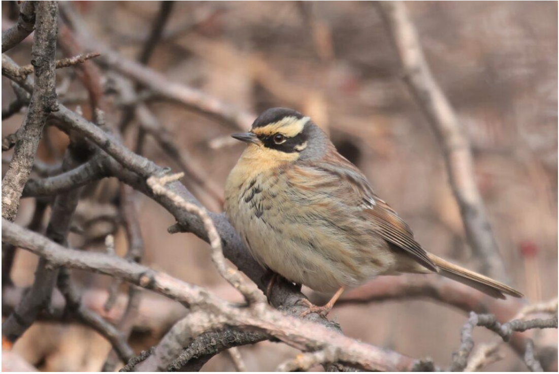
Siberian Accentor