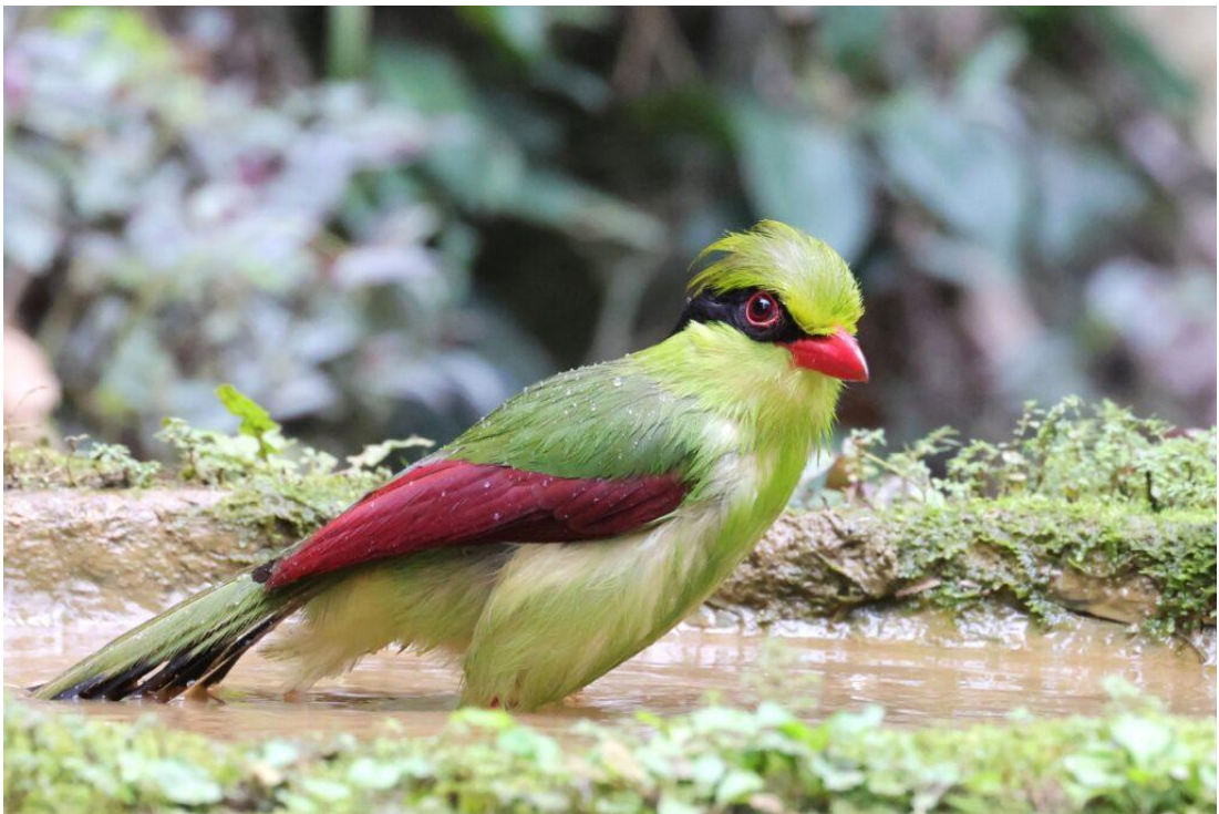
Indochinese Green Magpie