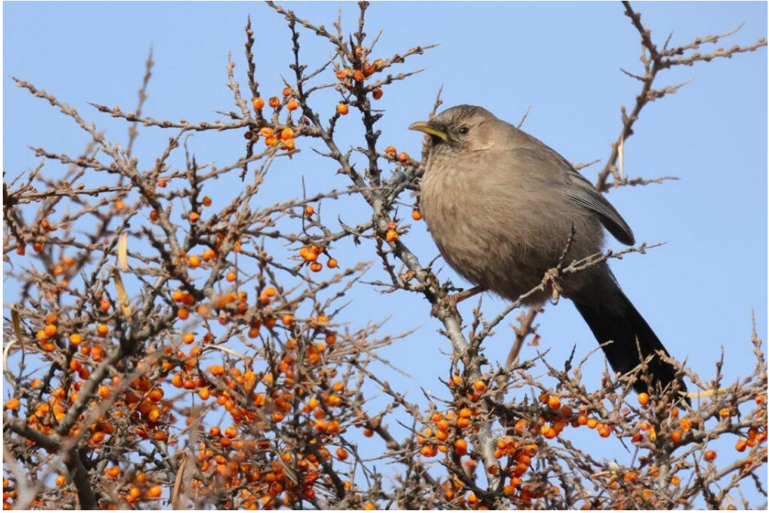
Plain Laughingthrush