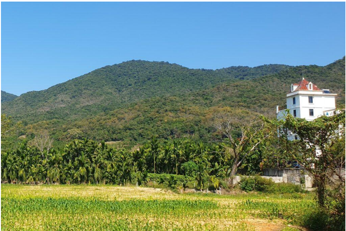
Hainan