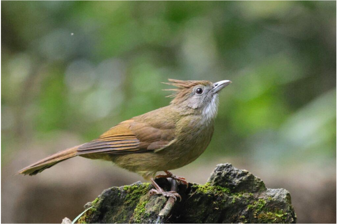
Puff-throated Bulbul