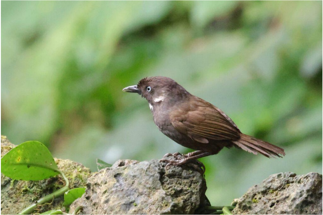
Nonggang Babbler