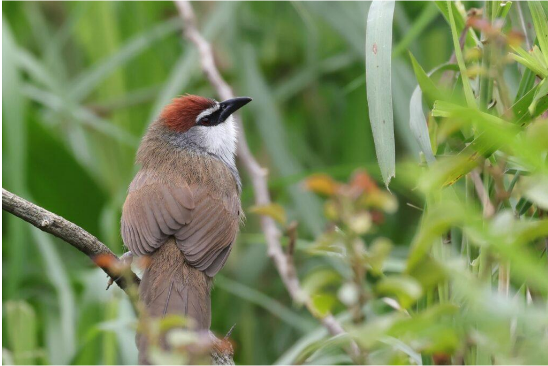
Chestnut-capped Babbler