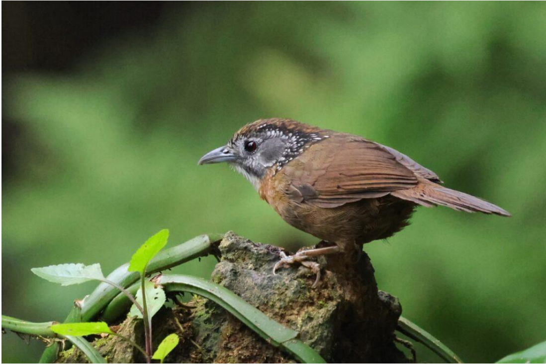
Spot-necked Babbler