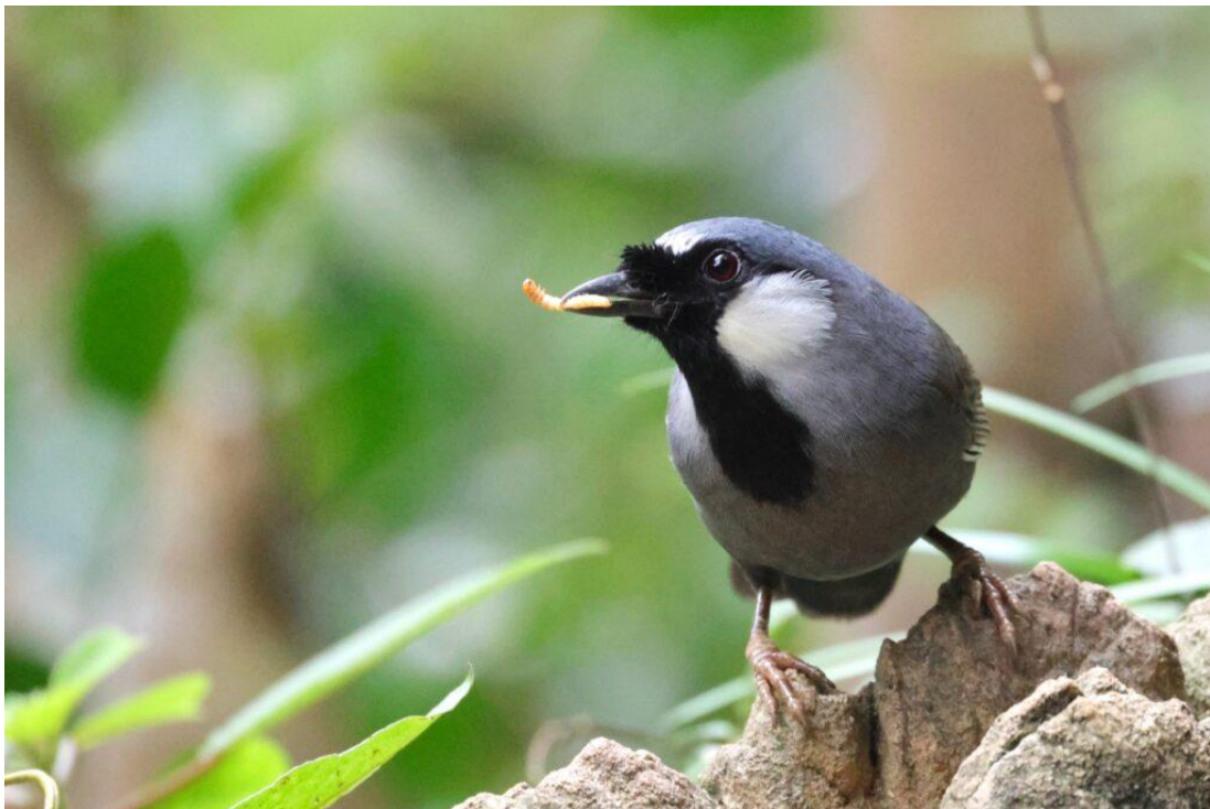
Black-throated Laughingthrush

Asian Red-cheeked Squirrel Dremomys rufigenis A few in Nonggang.