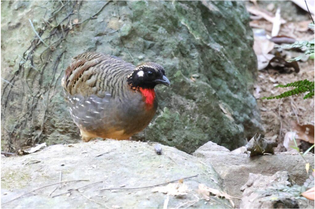
Hainan Partridge