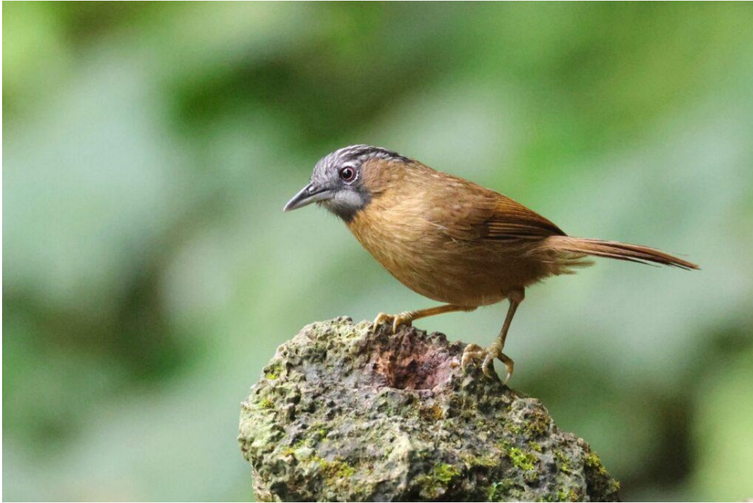
Grey-throated Babbler