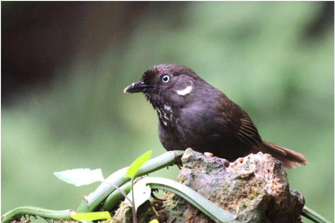
Nonggang Babbler