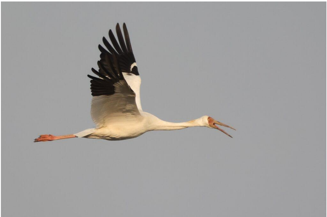
Siberian Crane