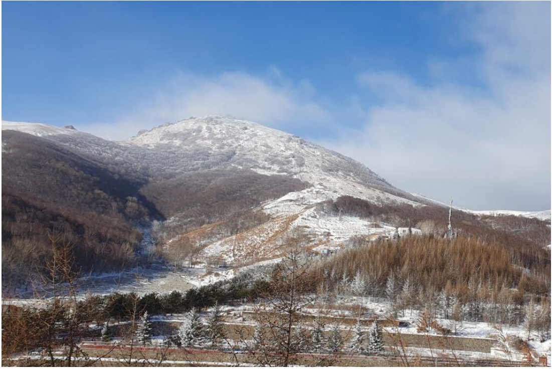
Lingshan Mountains