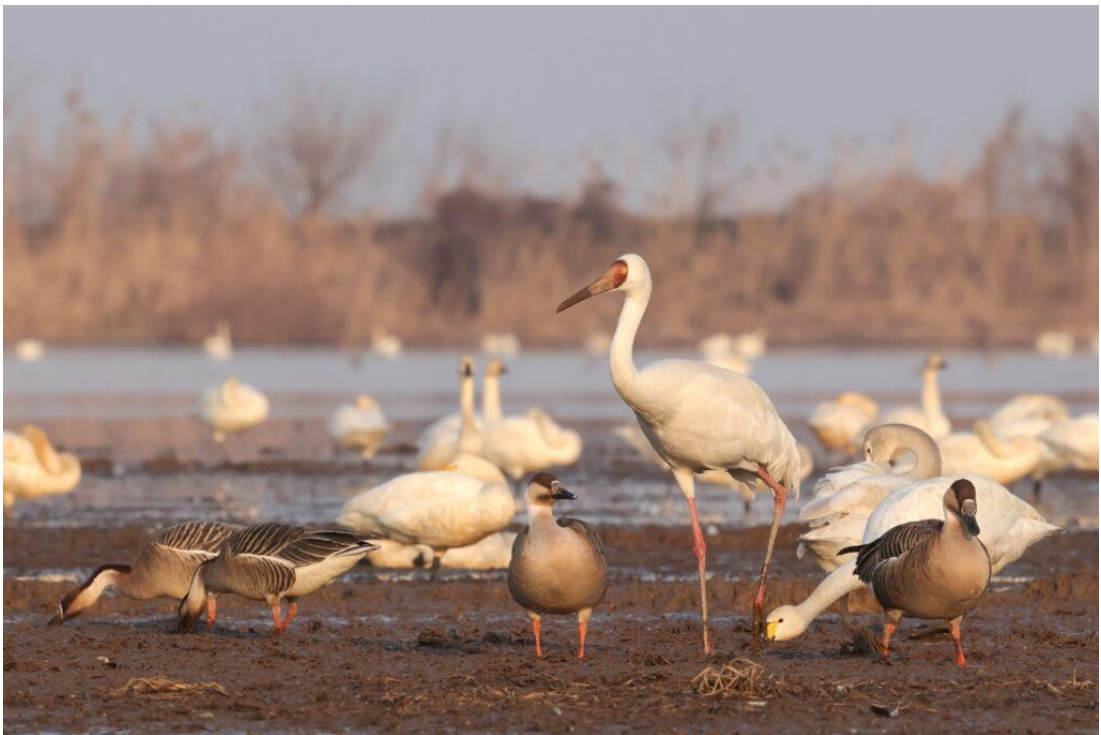
Siberian Crane with Swan Geese and Tundra Swans