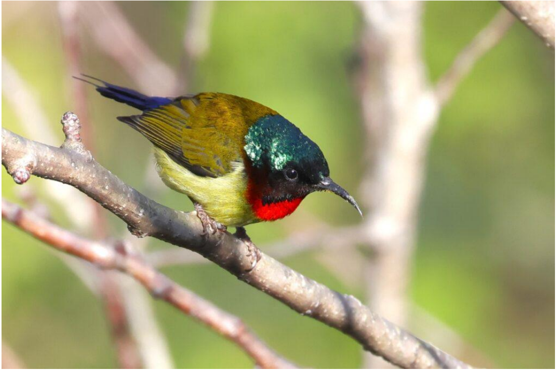
Fork-tailed Sunbird