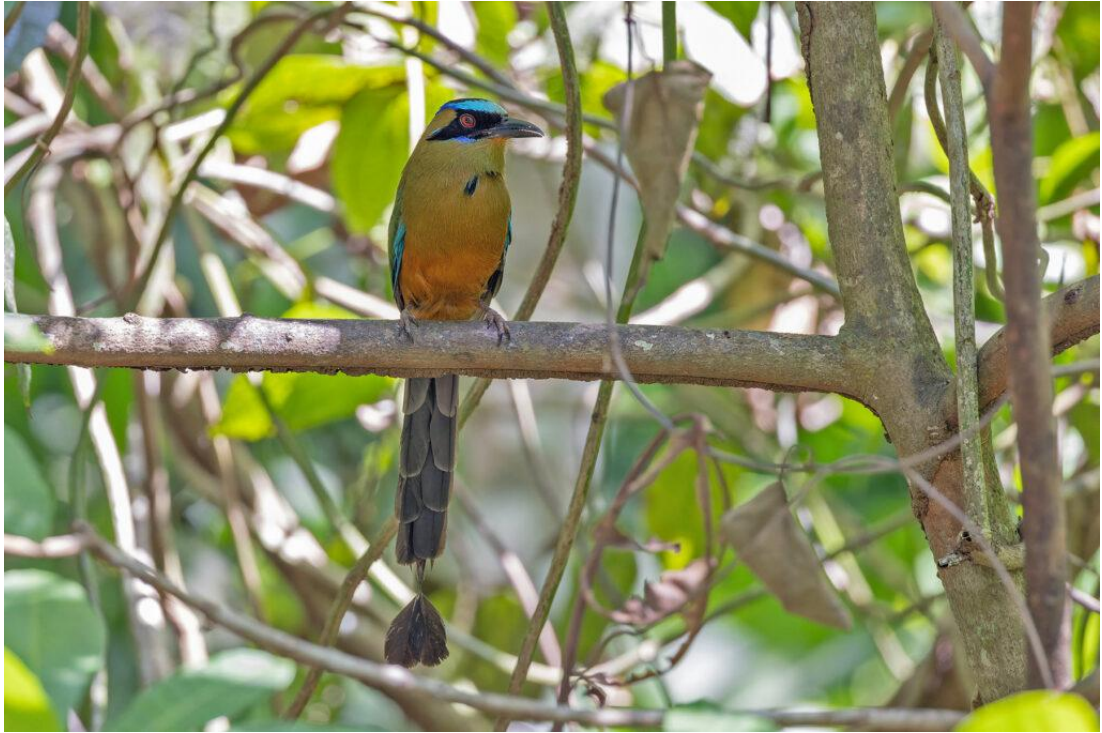
Whooping Motmot