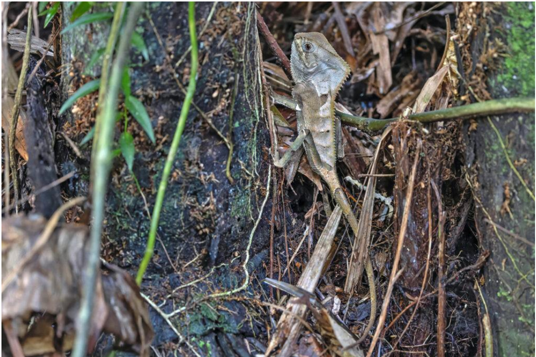
Basilisk Lizard