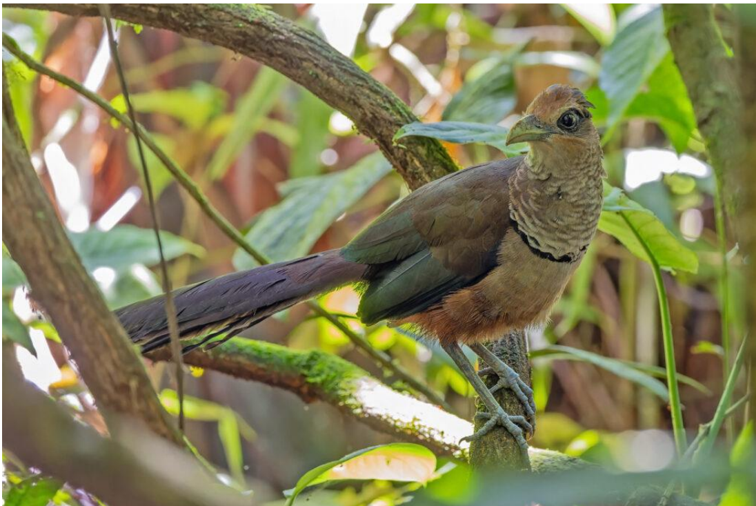
Rufous-vented Ground Cuckoo