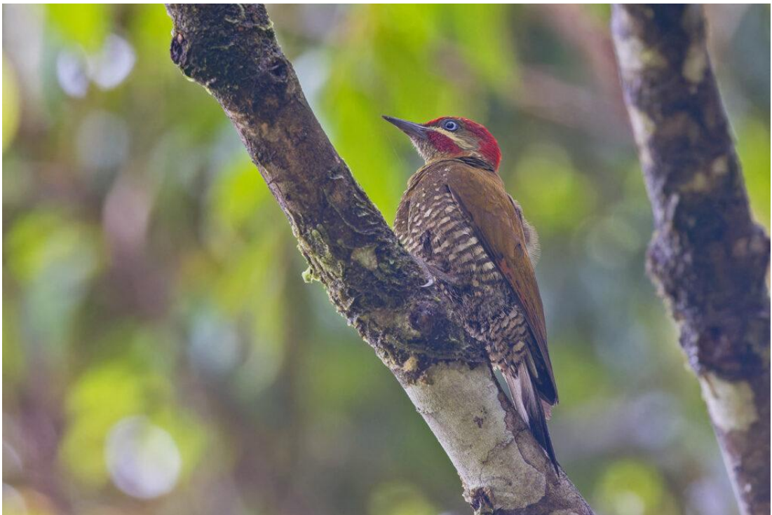
Stripe-cheeked Woodpecker