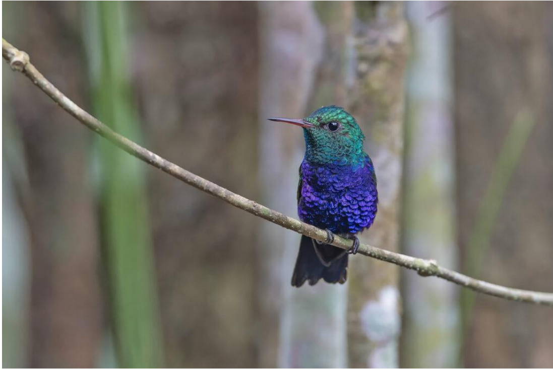
Violet-bellied Hummingbird