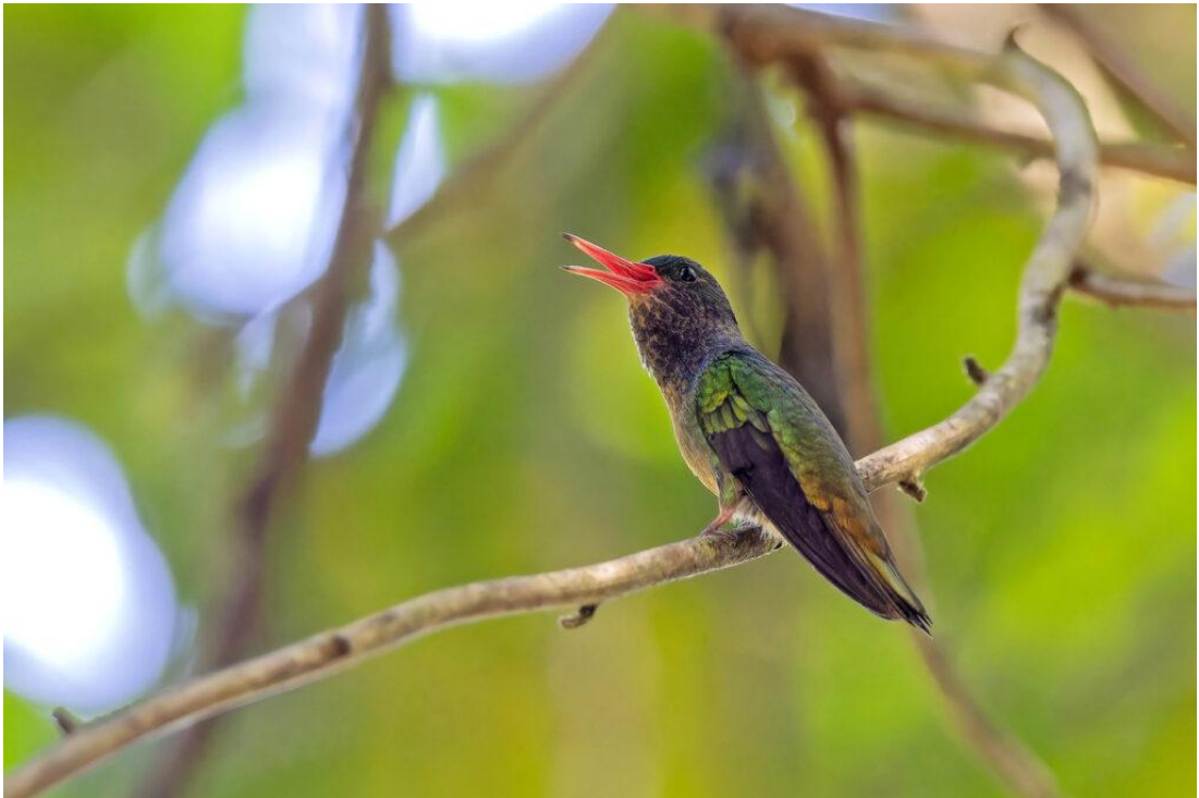
Blue-throated Sapphire