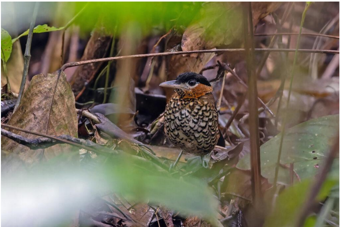
Black-crowned Antpitta