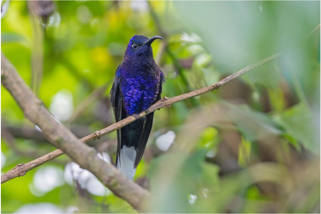
Violet Sabrewing