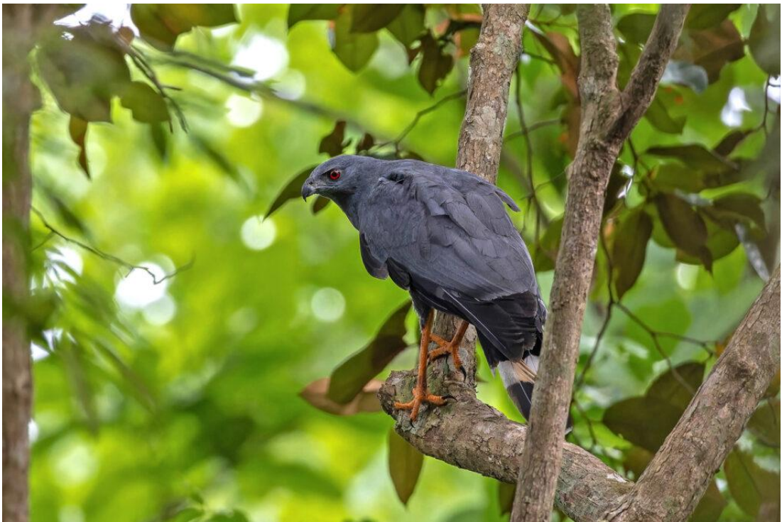
Crane Hawk