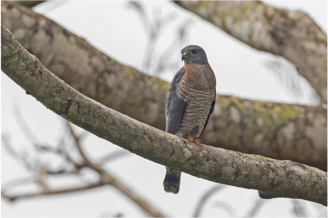
Double-toothed Kite