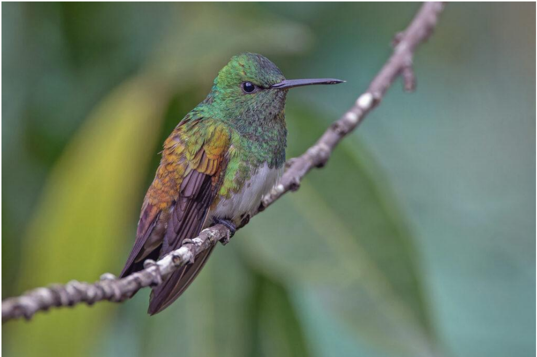
Snowy-bellied Hummingbird