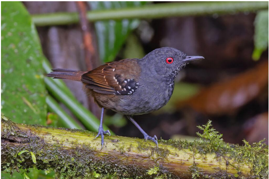
Dull-mantled Antbird