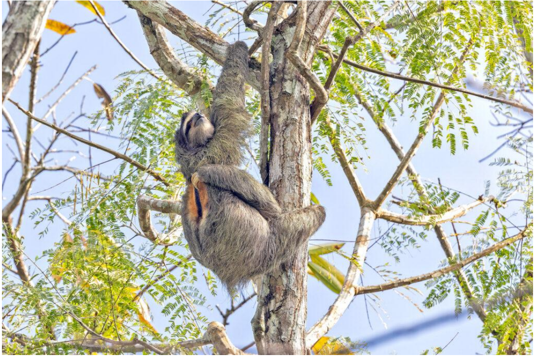
Brown-throated Three-toed Sloth