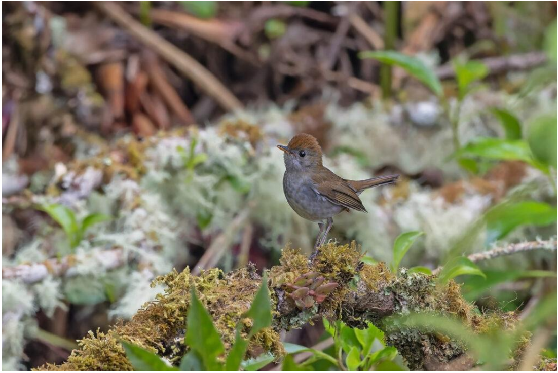
Ruddy-capped Nightingale-Thrush