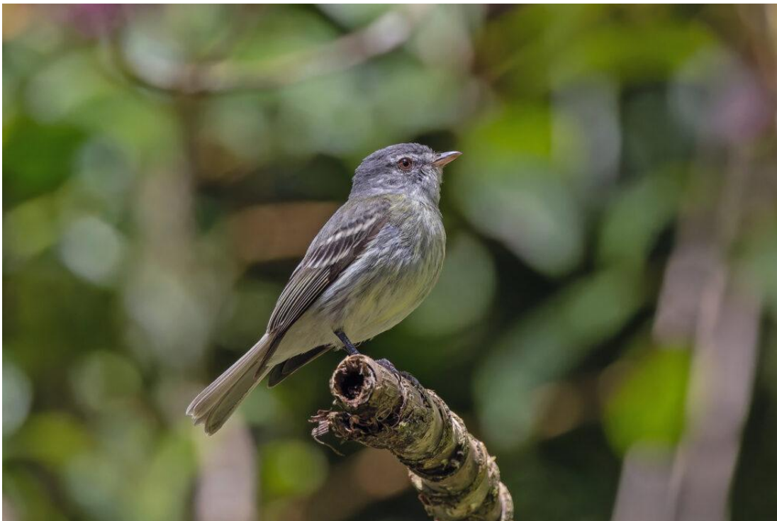
White-fronted Tyrannulet