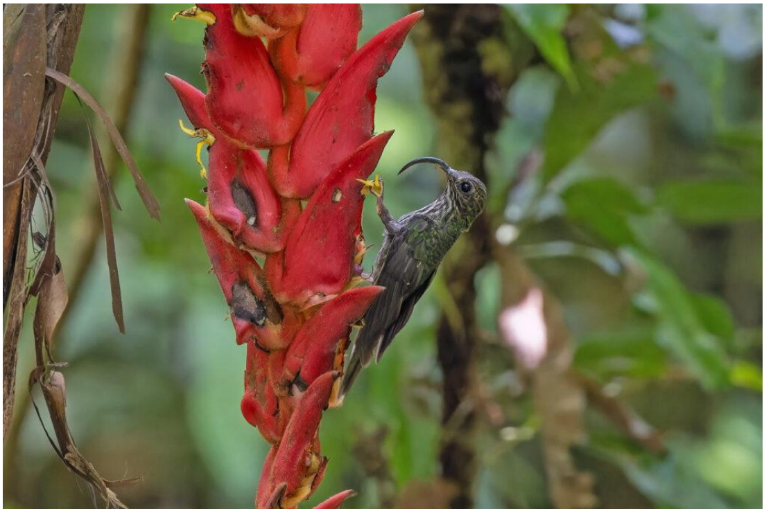
White-tipped Sicklebill