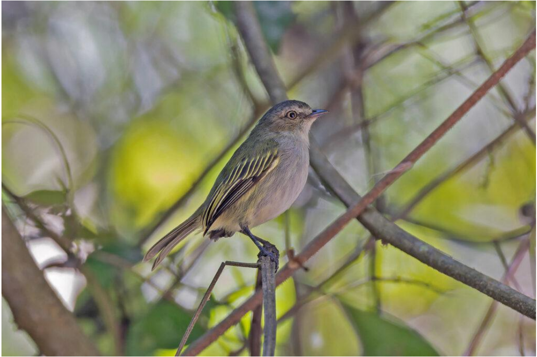
Mistletoe Tyrannulet