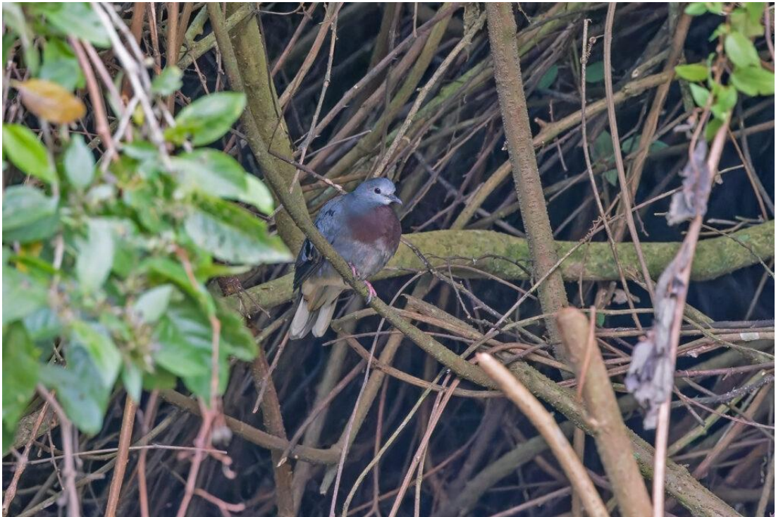
Maroon-chested Ground Dove