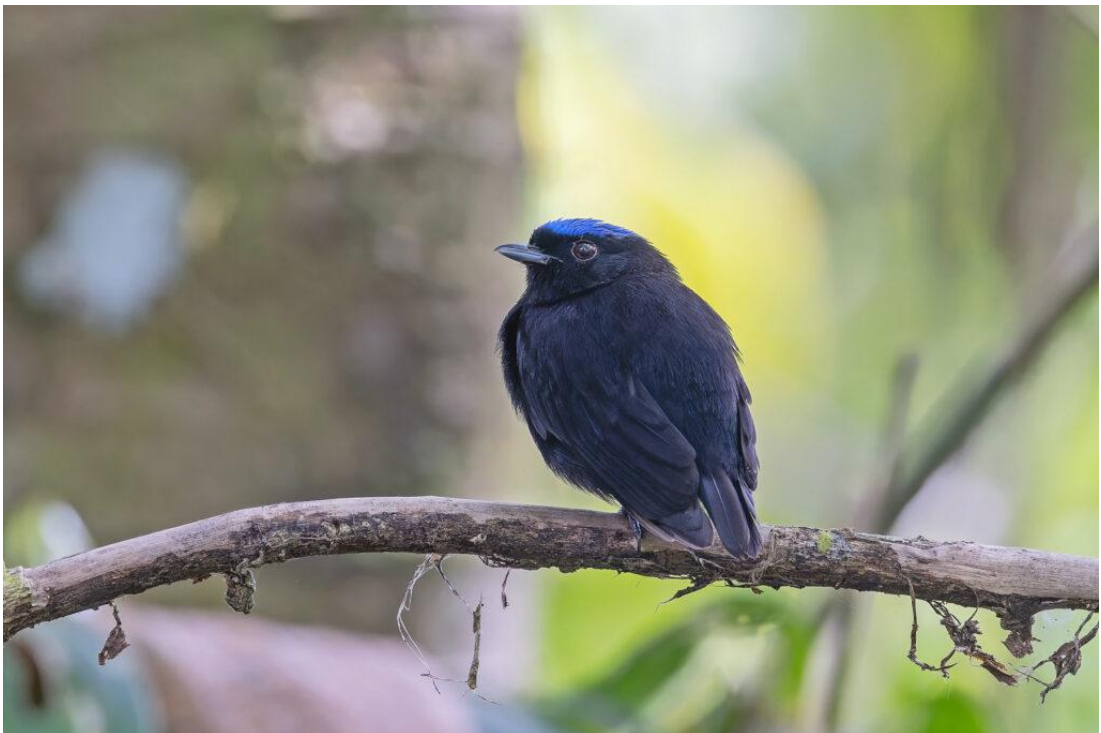
Velvety Manakin