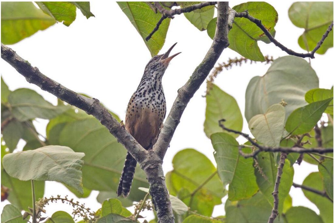
Band-backed Wren