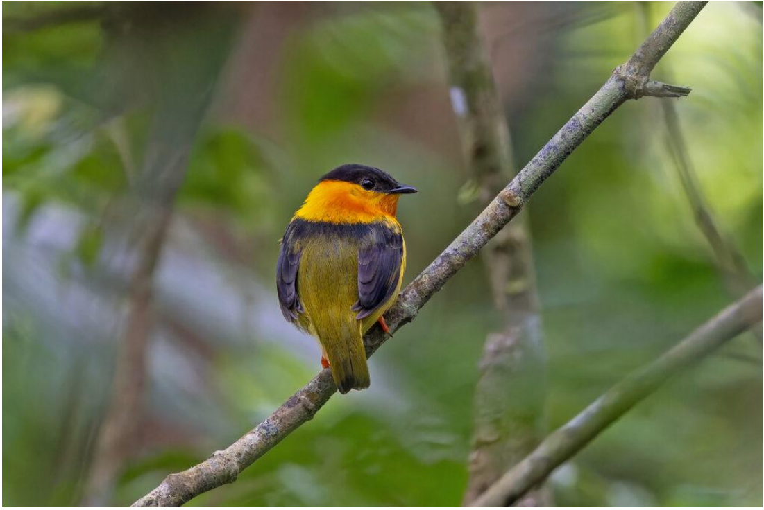
Orange-collared Manakin