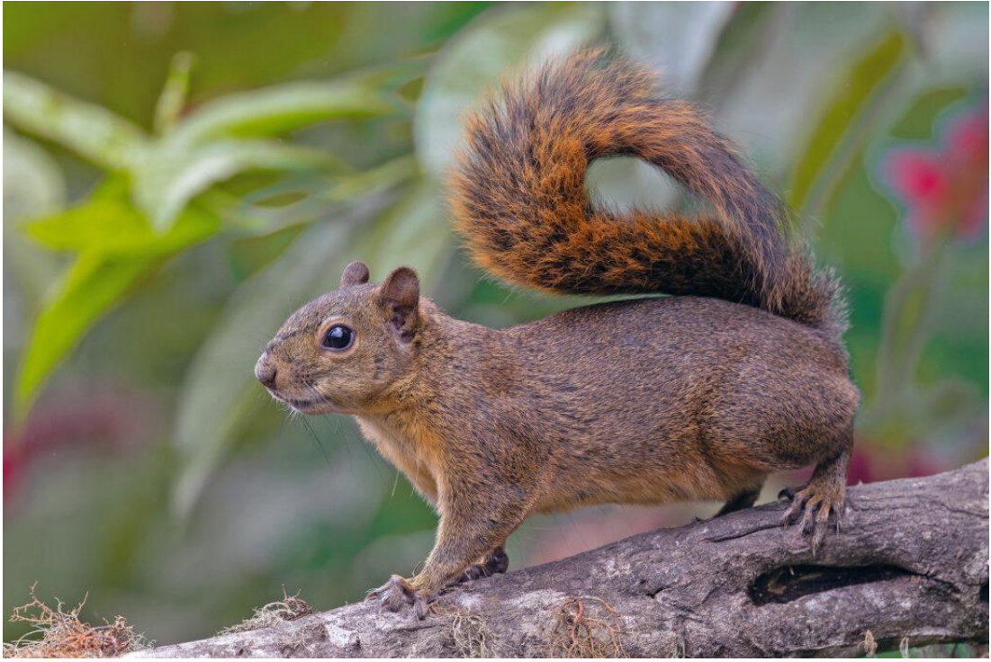
Red-tailed Squirrel