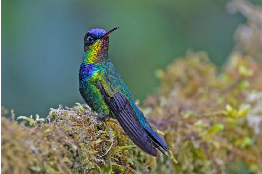
Fiery-throated Hummingbird