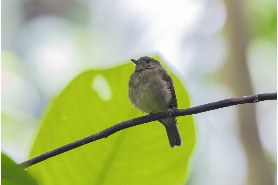
Choco Manakin