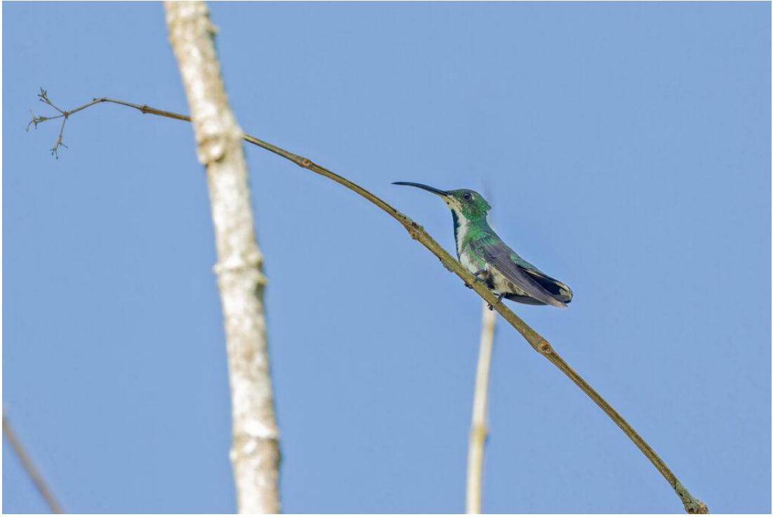
Veraguan Mango