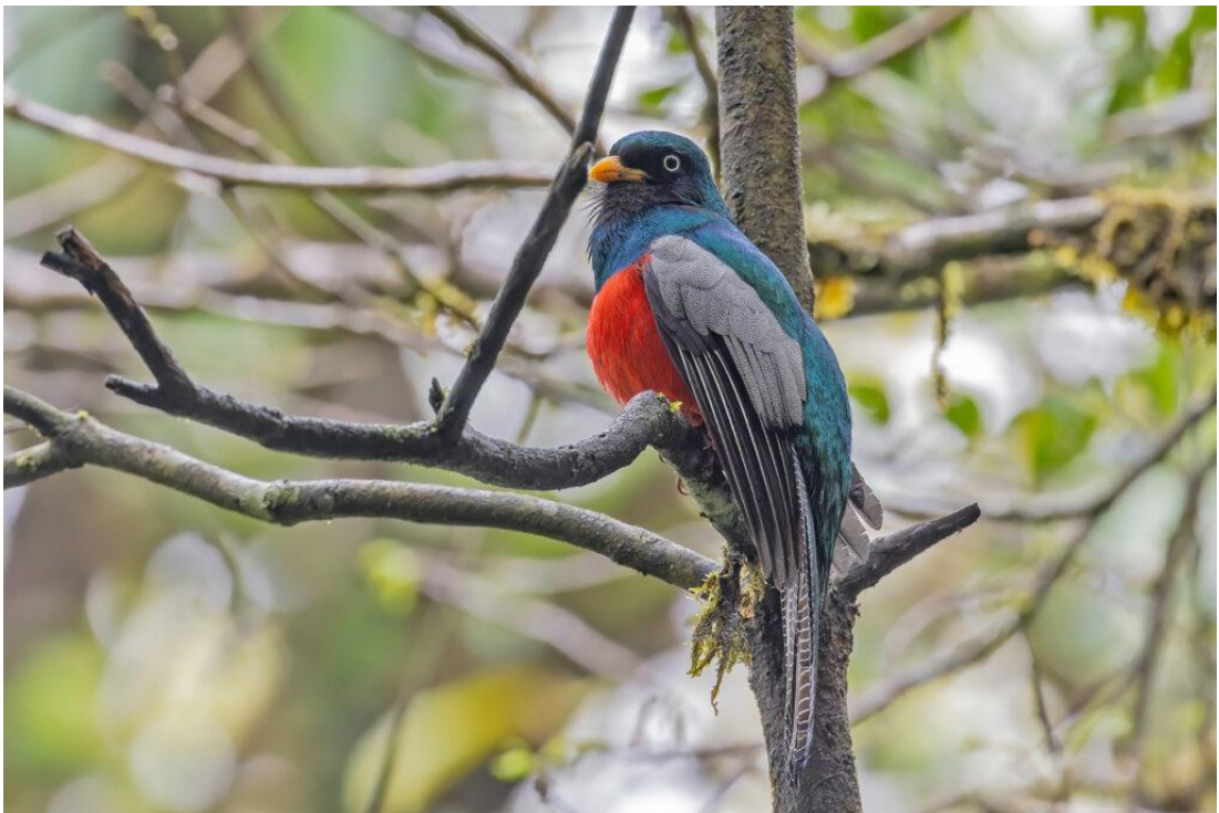
Lattice-tailed Trogon