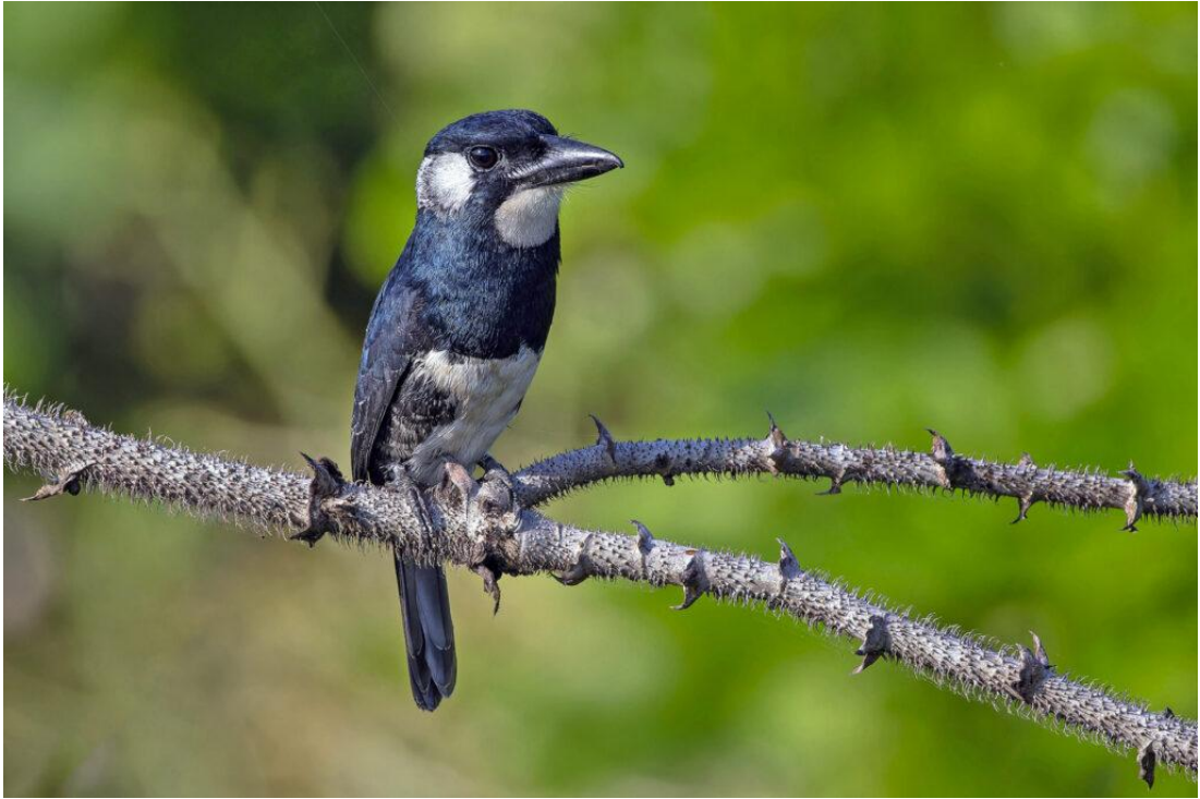
Black-breasted Puffbird