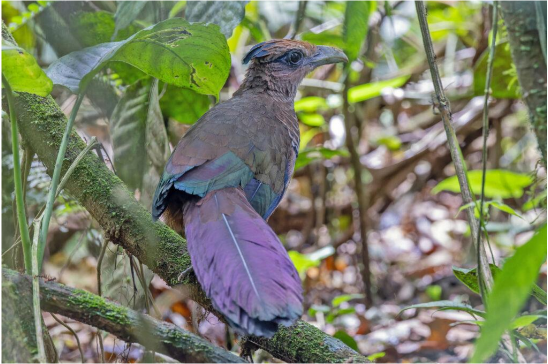
Rufous-vented Ground Cuckoo