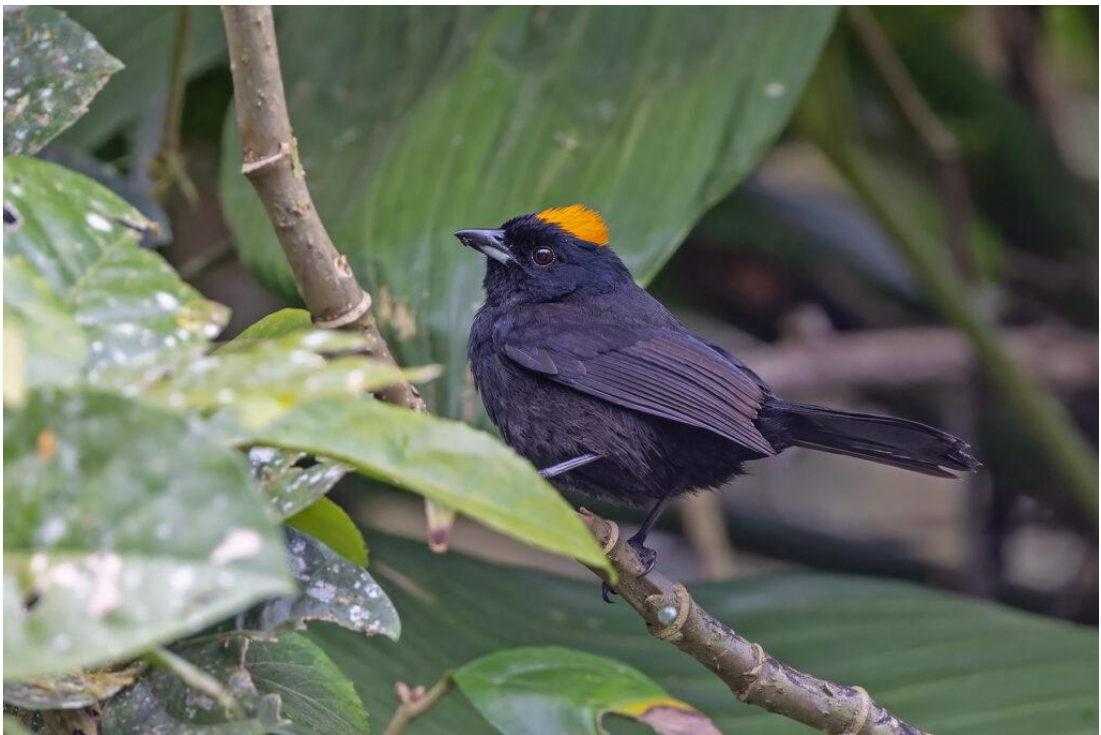
Tawny-crested Tanager