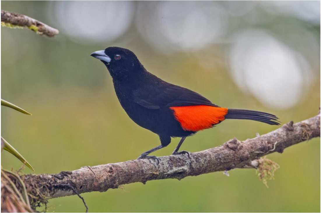
Scarlet-rumped Tanager