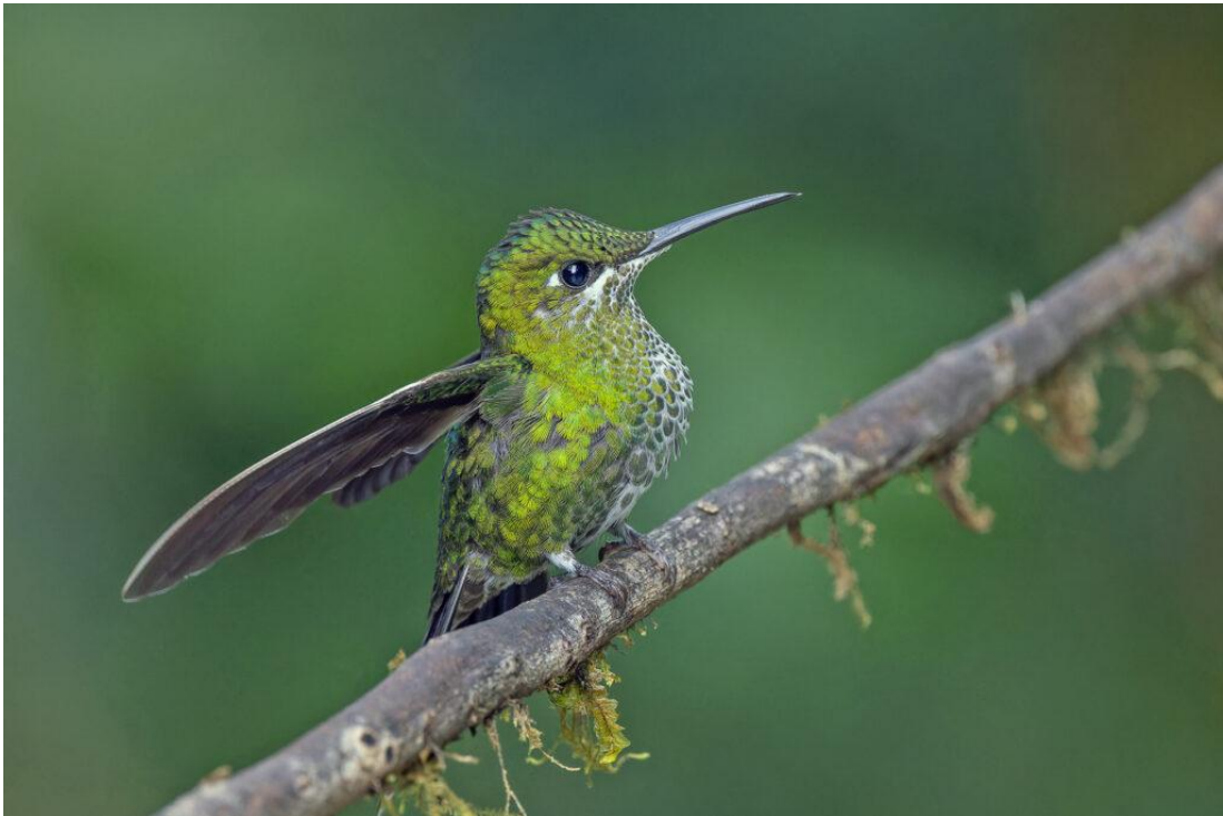
Green-crowned Brilliant