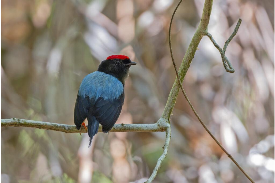
Lance-tailed Manakin