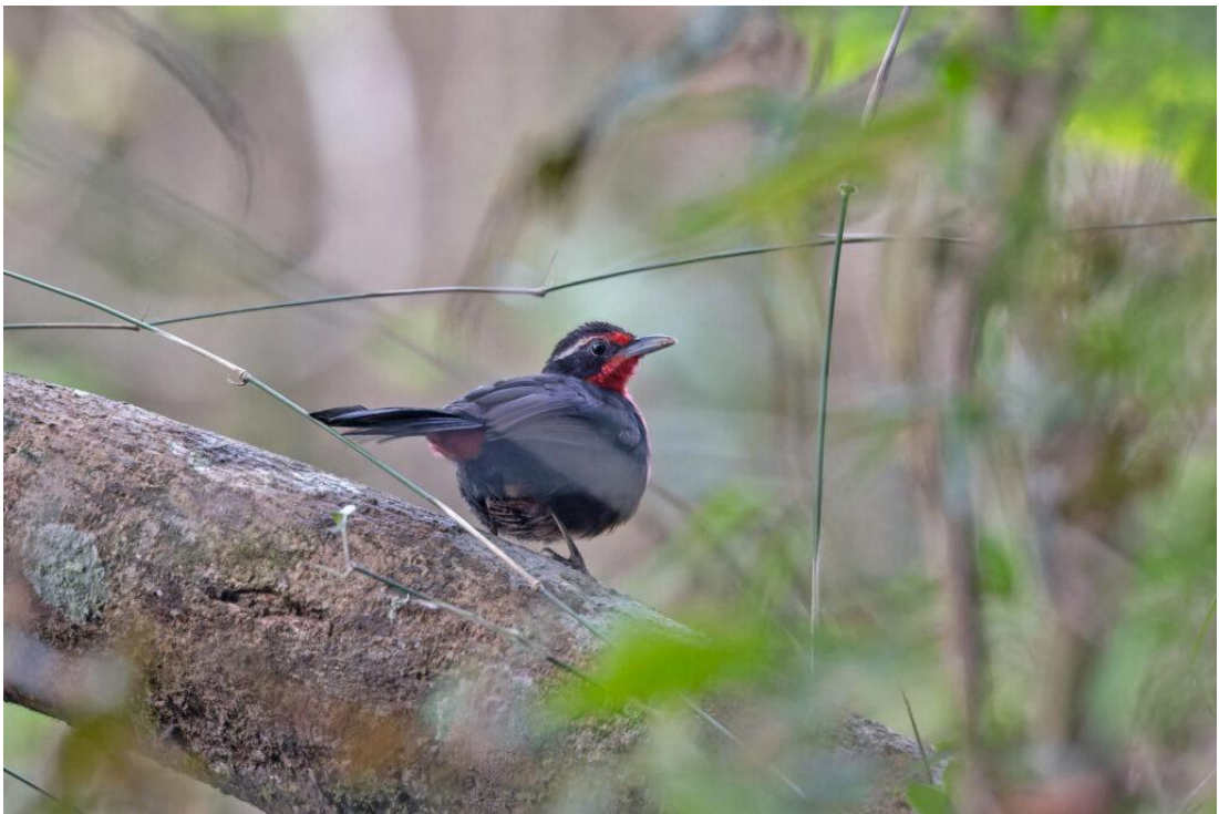
Rosy Thrush-tanager