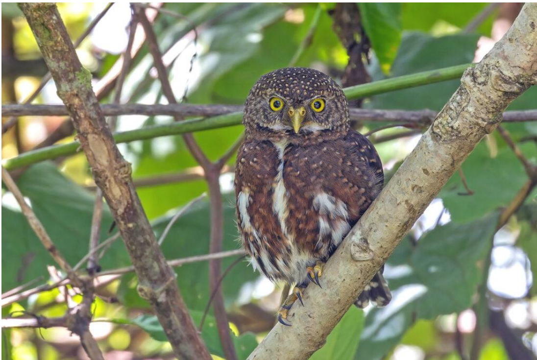
Costa Rican Pygmy Owl