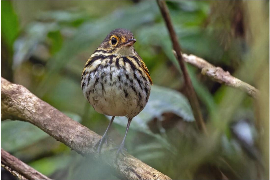
Streak-chested Antpitta