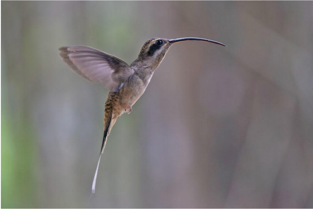
Long-billed Hermit (image by Pete Morris)