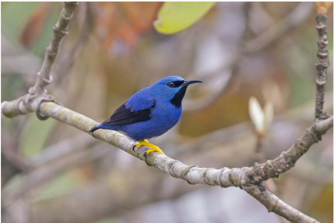
Shining Honeycreeper