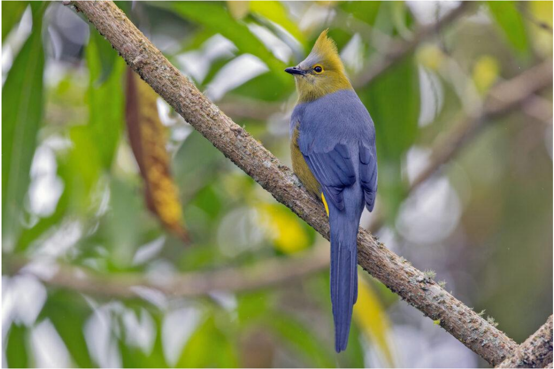
Long-tailed Silky-flycatcher