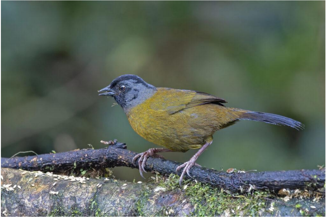
Large-footed Finch