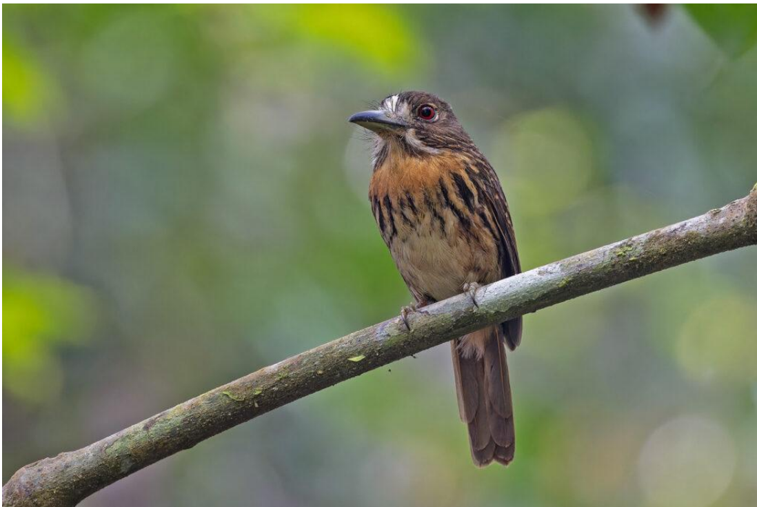
White-whiskered Puffbird