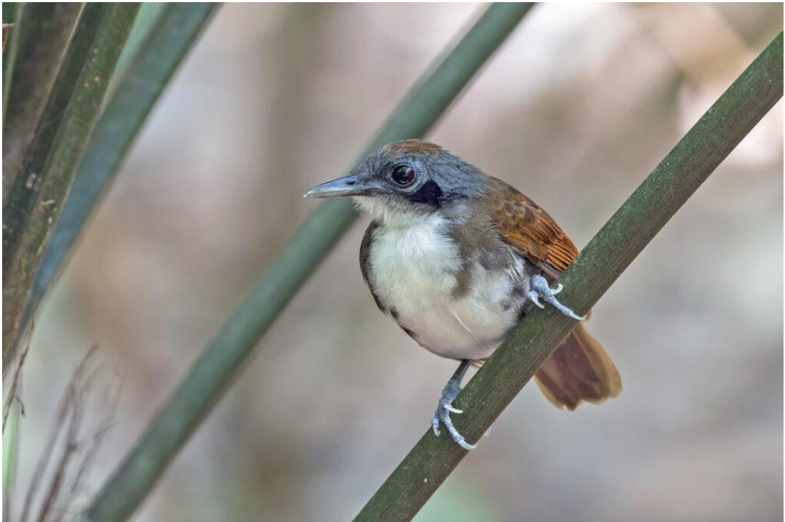
Bicolored Antbird