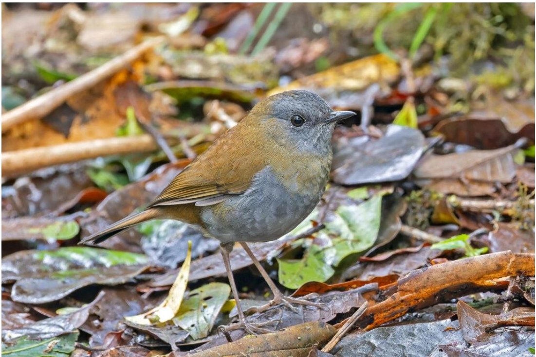
Black-billed Nightingale-Thrush