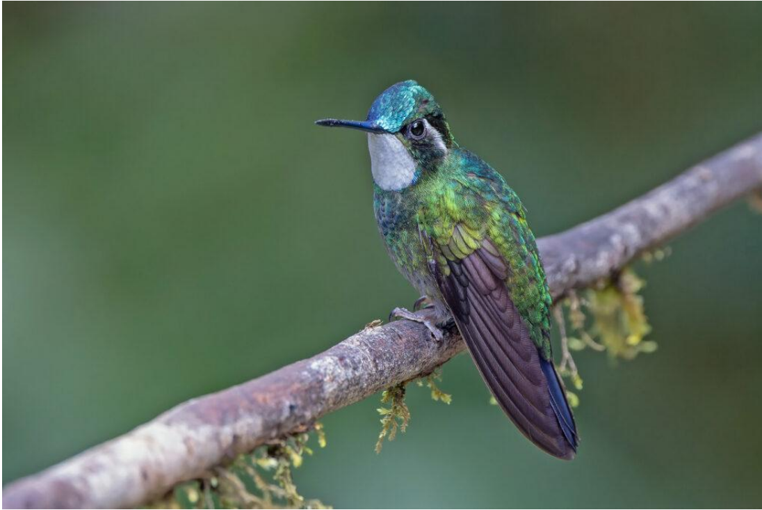
White-throated Mountaingem