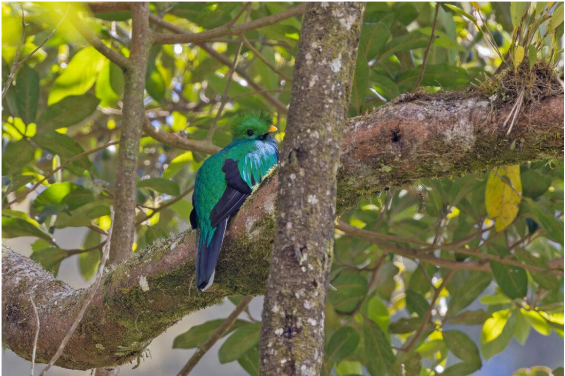
Resplendent Quetzal