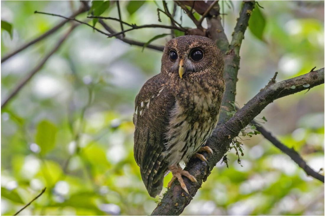
Mottled Owl