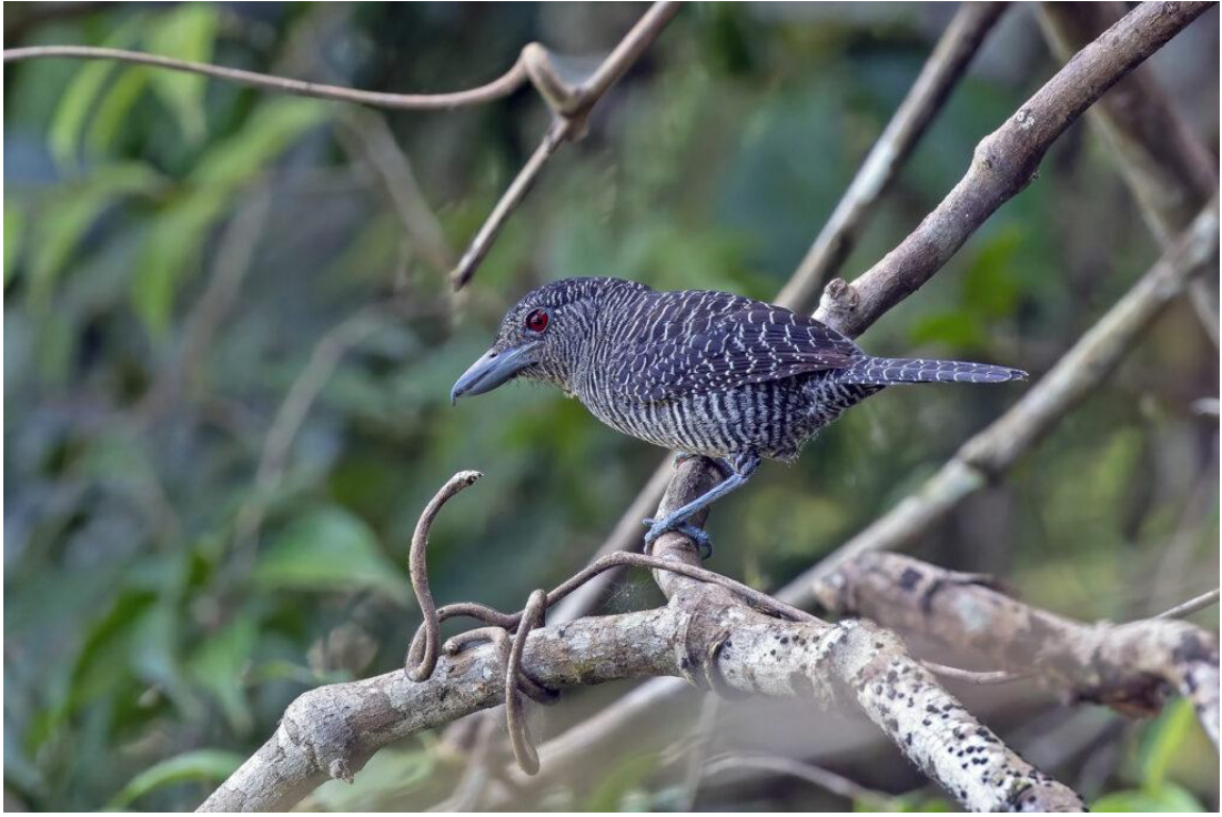
Fasciated Antshrike