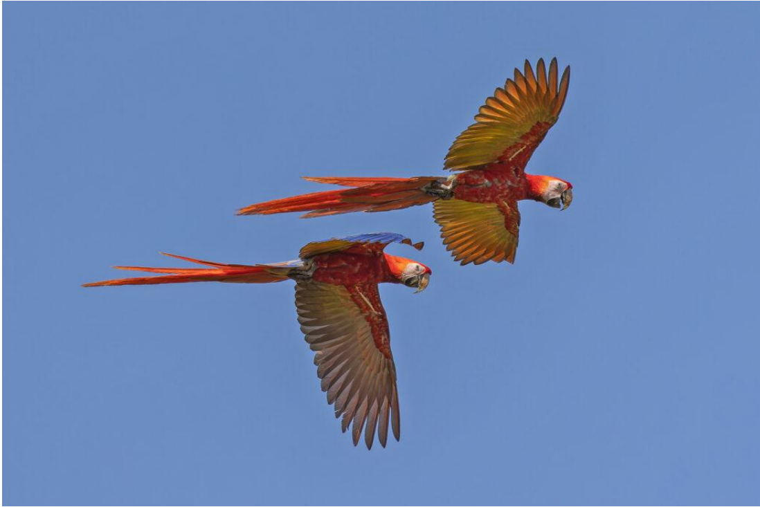
Scarlet Macaw