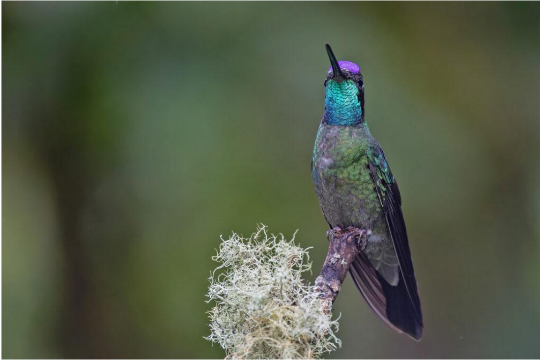
Talamanca Hummingbird