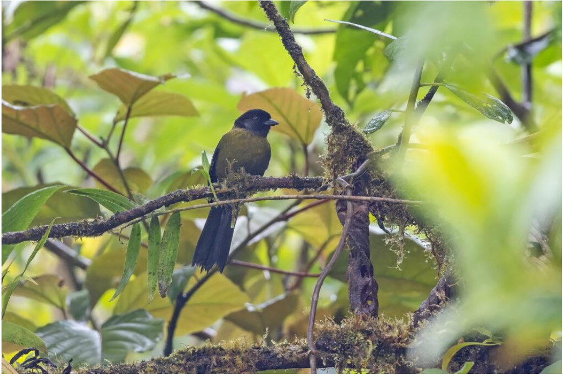
Yellow-green Brushfinch