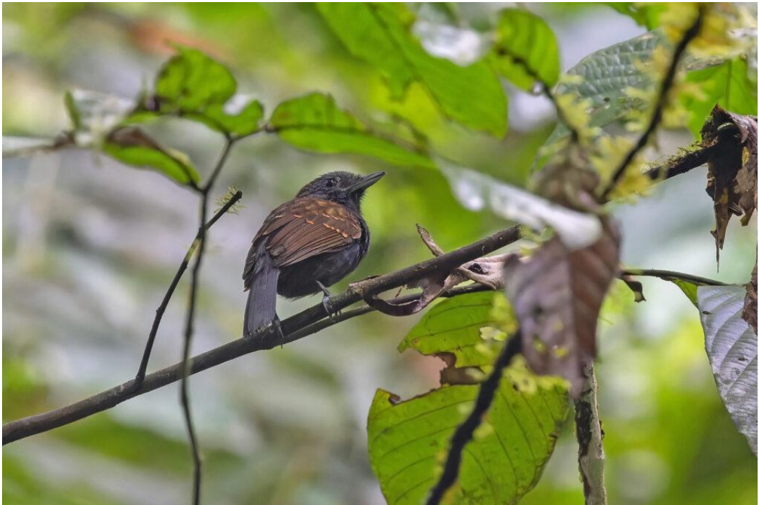
Speckled Antshrike