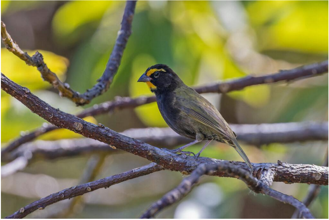
Yellow-faced (Coiba Island) Grassquit