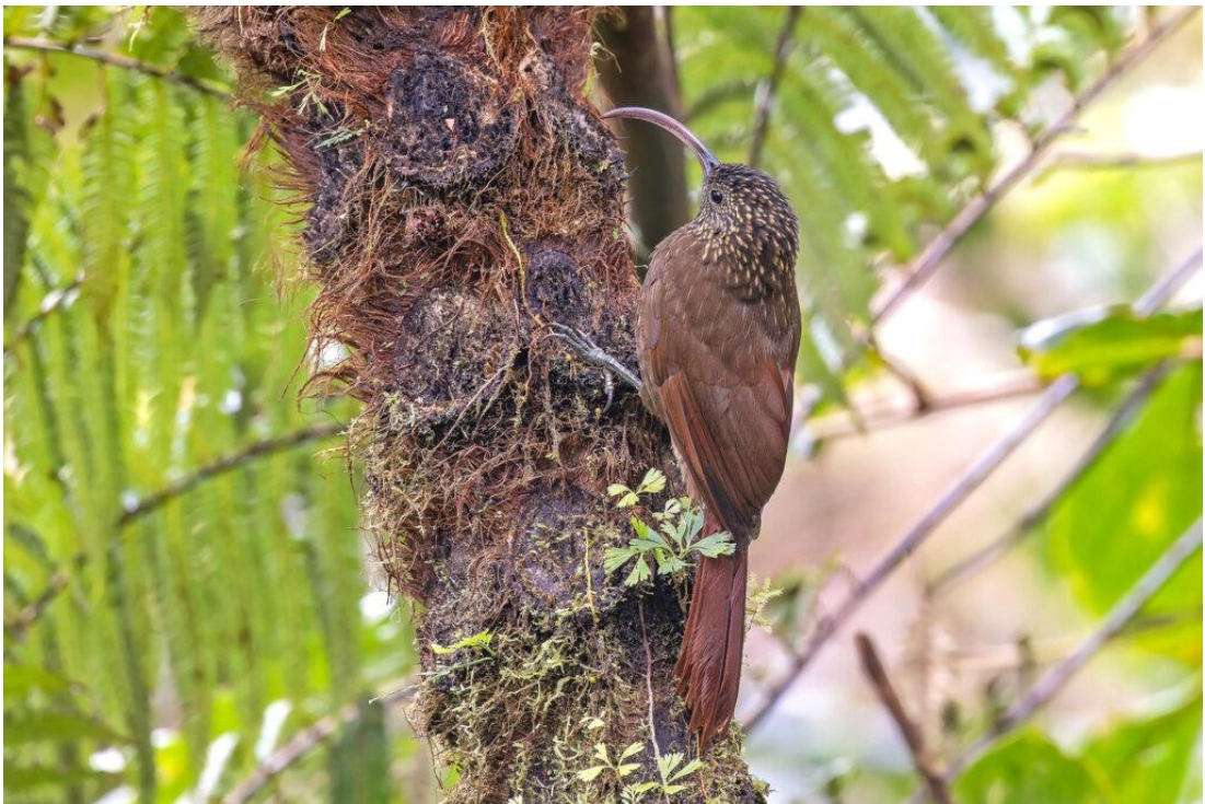
Brown-billed Scythebill