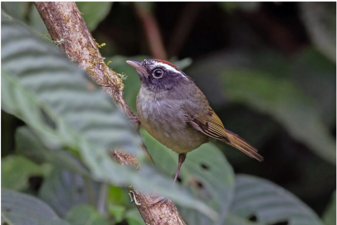
Black-eared Warbler