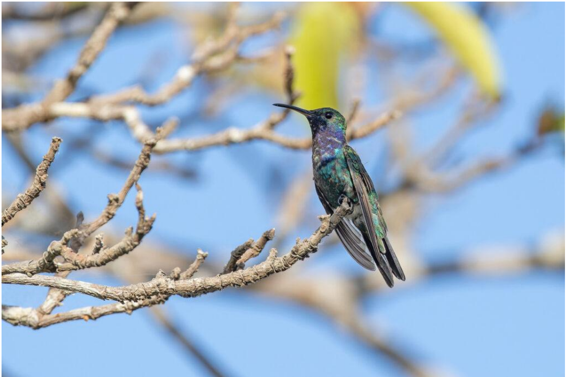
Sapphire-throated Hummingbird