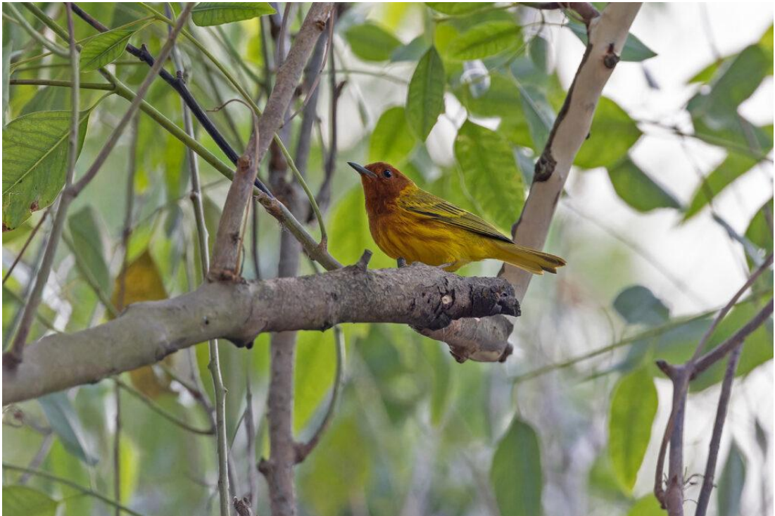
Mangrove Warbler