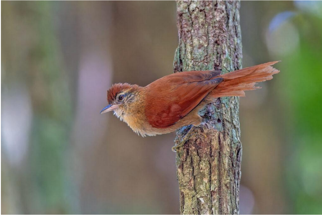
Coiba Spinetail