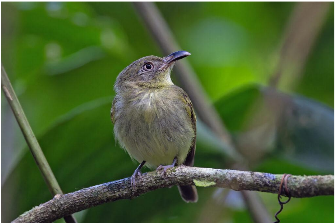
Southern Bentbill