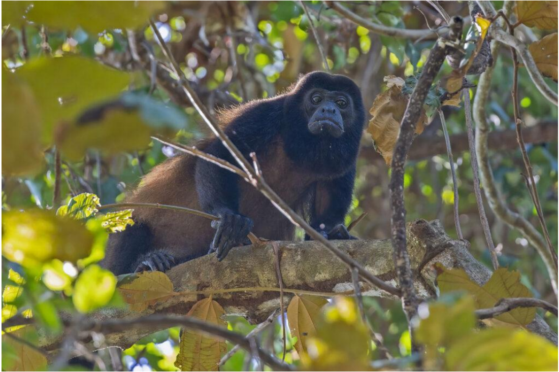
Mantled (Coiba Island) Howler