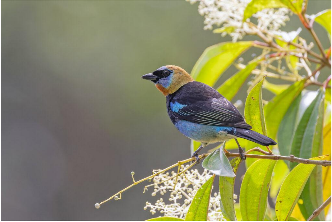
Golden-hooded Tanager