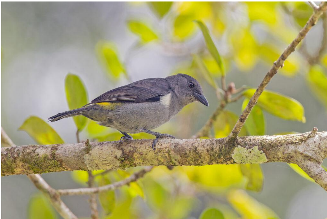
Sulphur-rumped Tanager