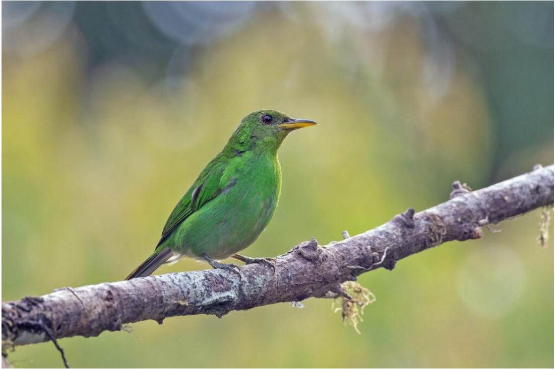
Green Honeycreeper