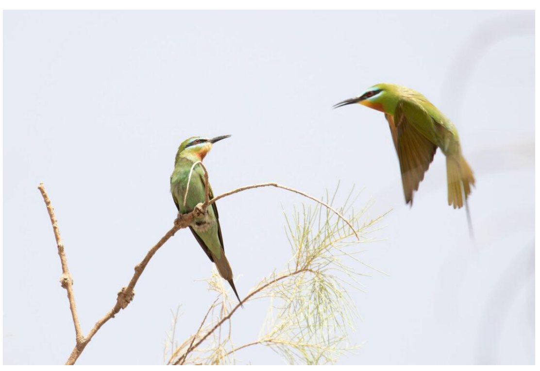
Blue-cheeked Bee-eater