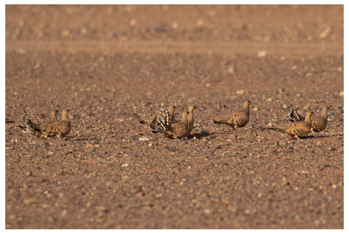
Spotted Sandgrouse