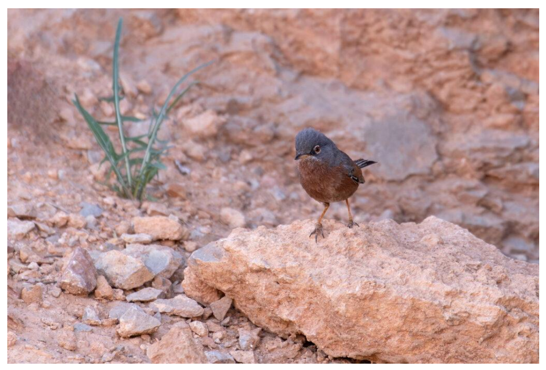
Tristram's Warbler