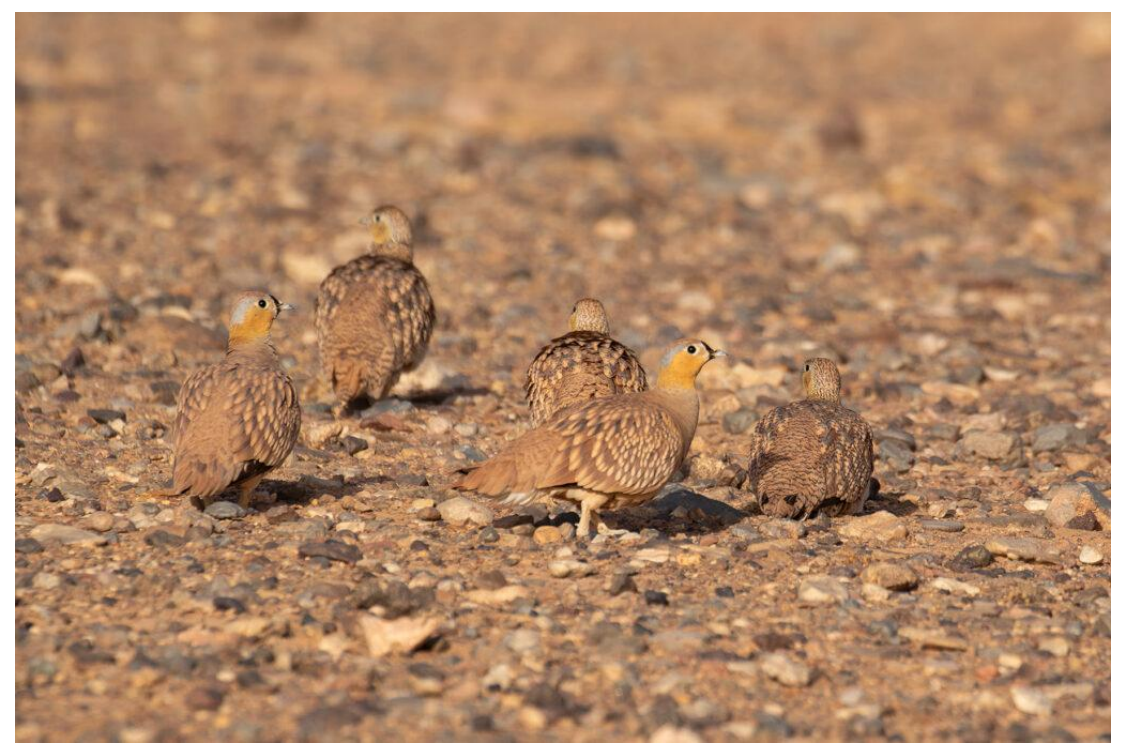
Crowned Sandgrouse