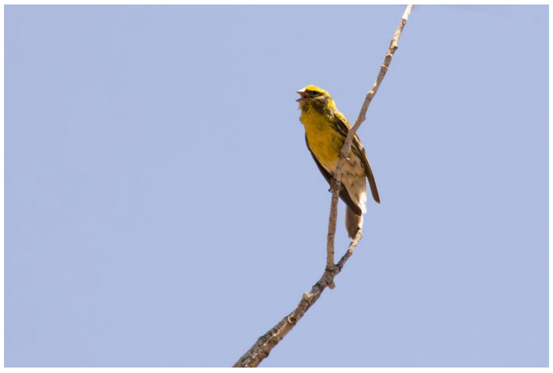
European Serin