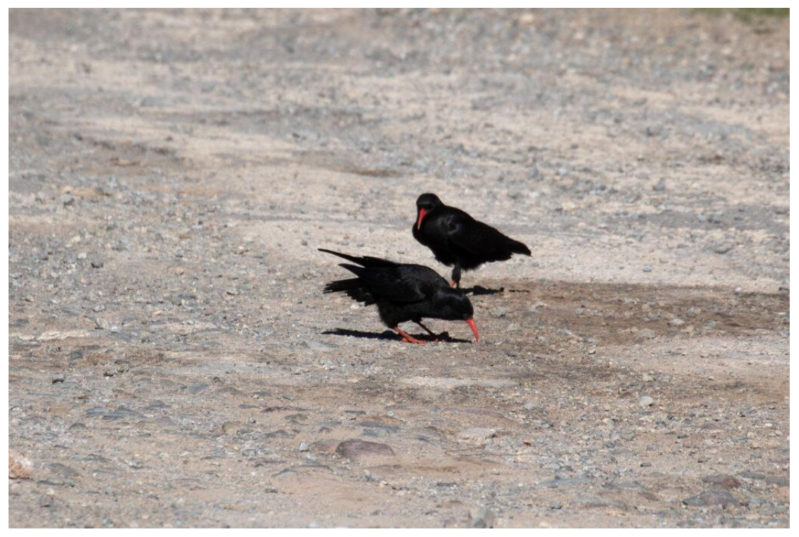
Red-billed Chough