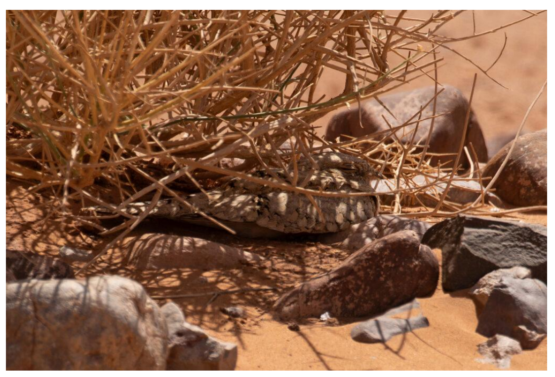
Egyptian Nightjar