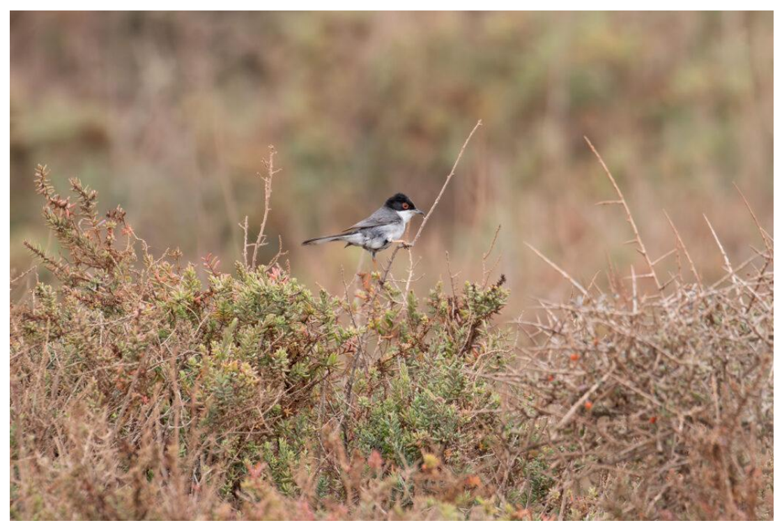
Sardinian Warbler (image by Diedert Koppenol)