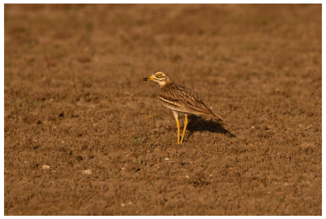
Eurasian Stone-curlew