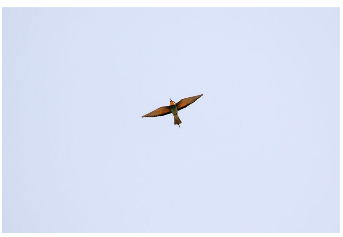
European Bee-eater