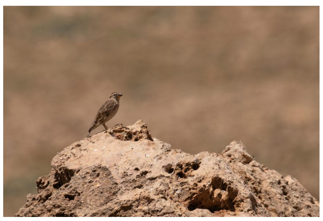
Rock Sparrow