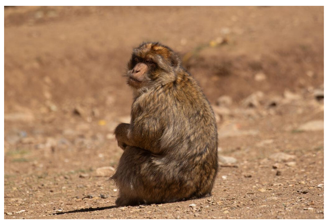
Barbary Macaque