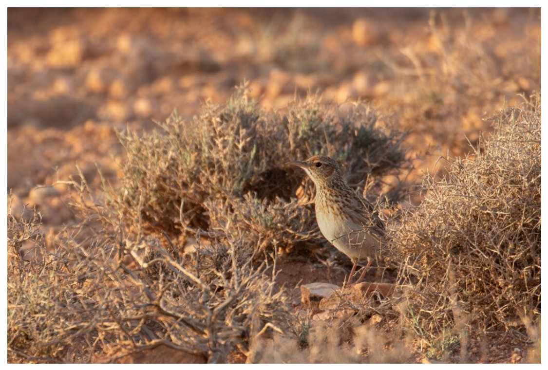
Dupont's Lark