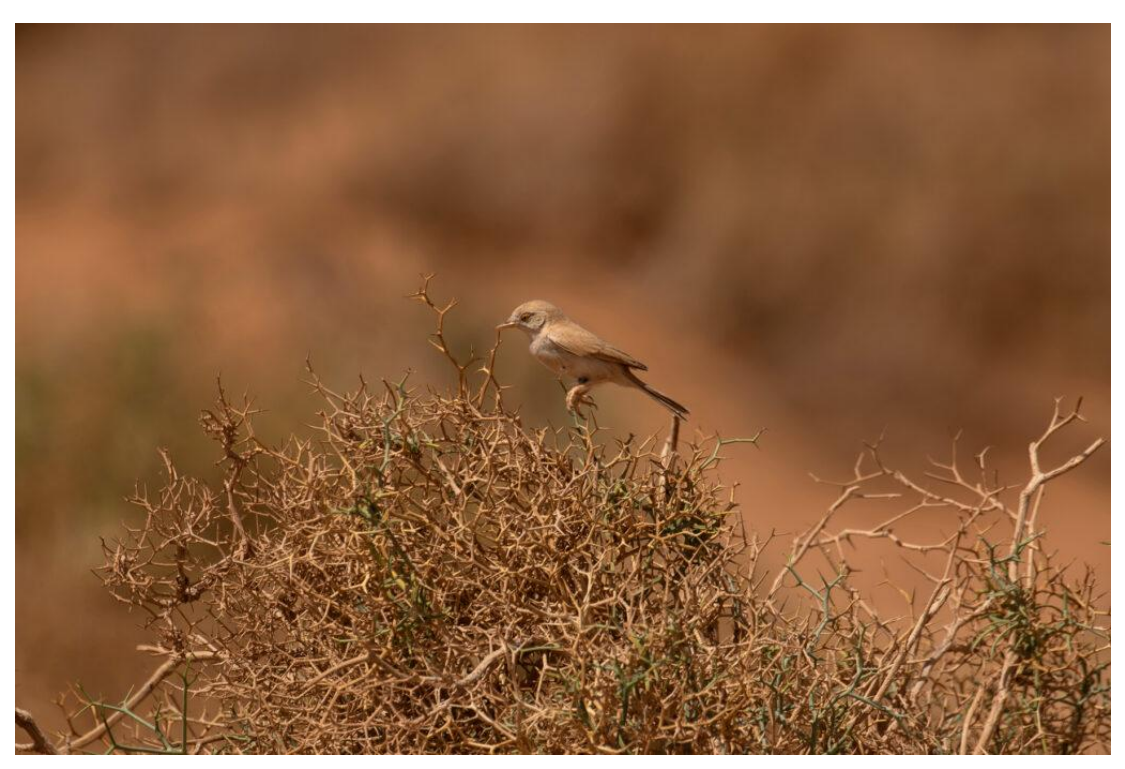
African Desert Warbler