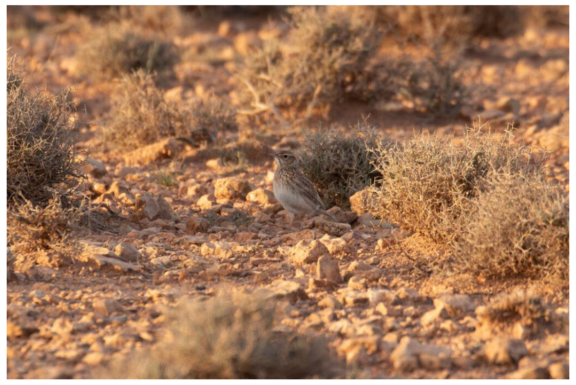
Dupont's Lark