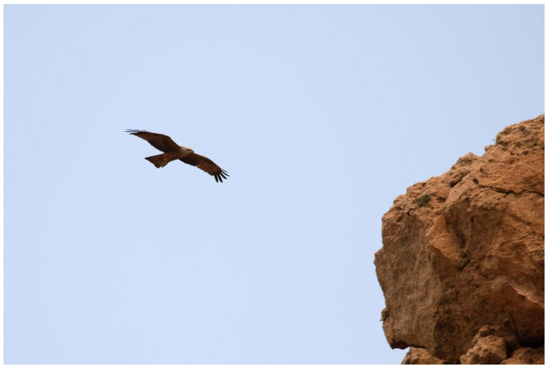
Black Kite