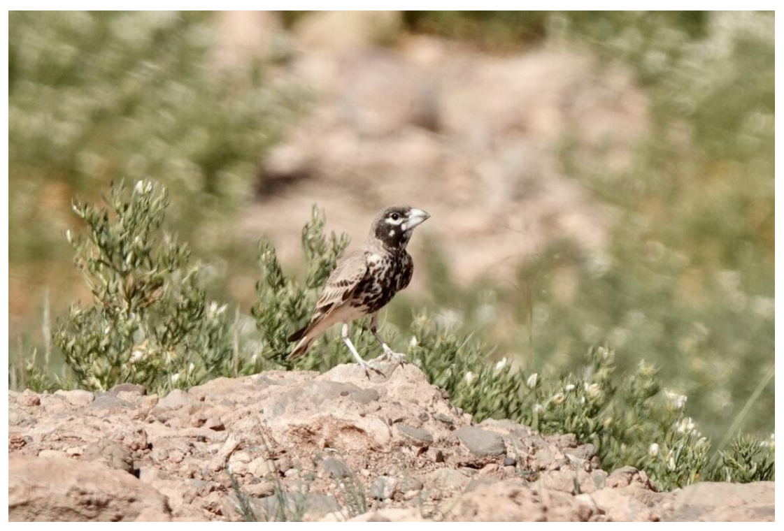
Thick-billed Lark