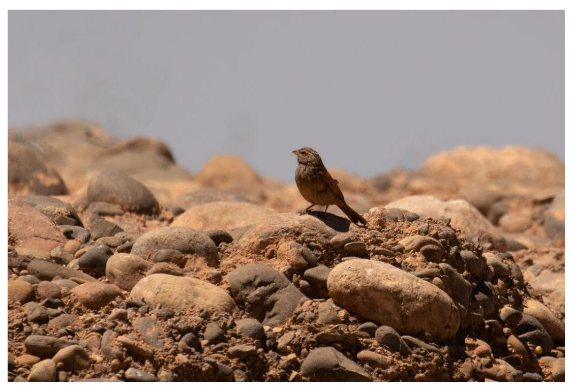
House Bunting