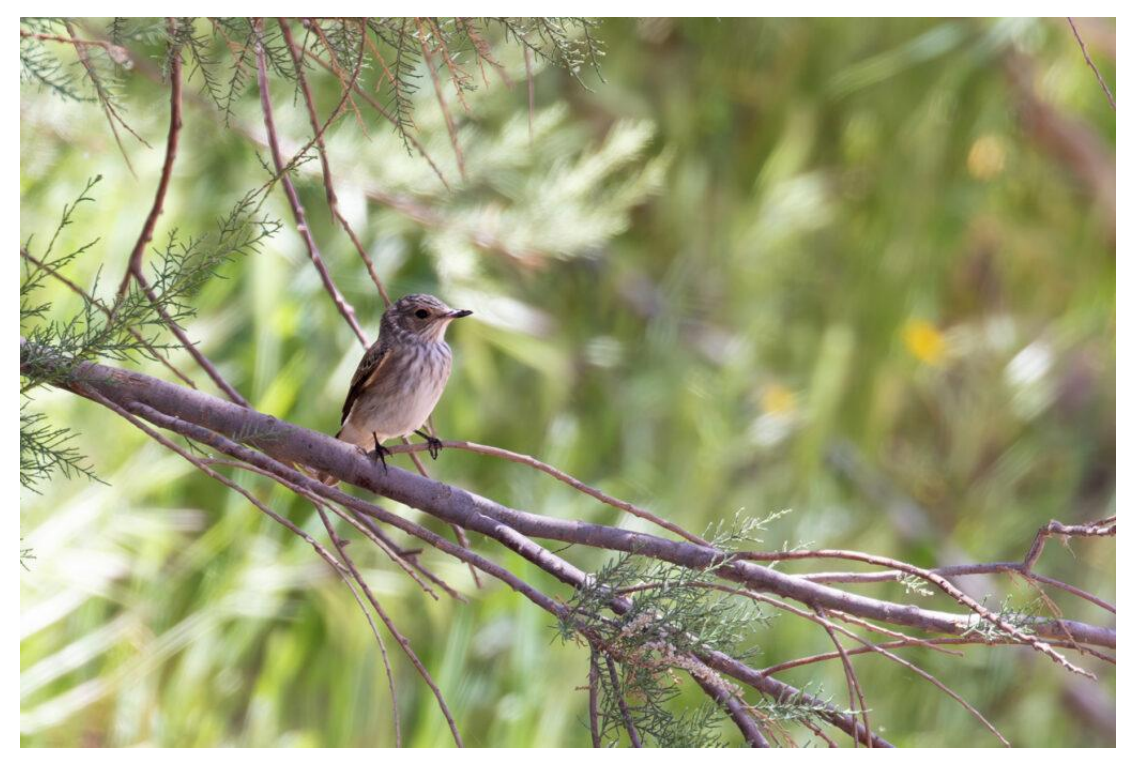
Spotted Flycatcher