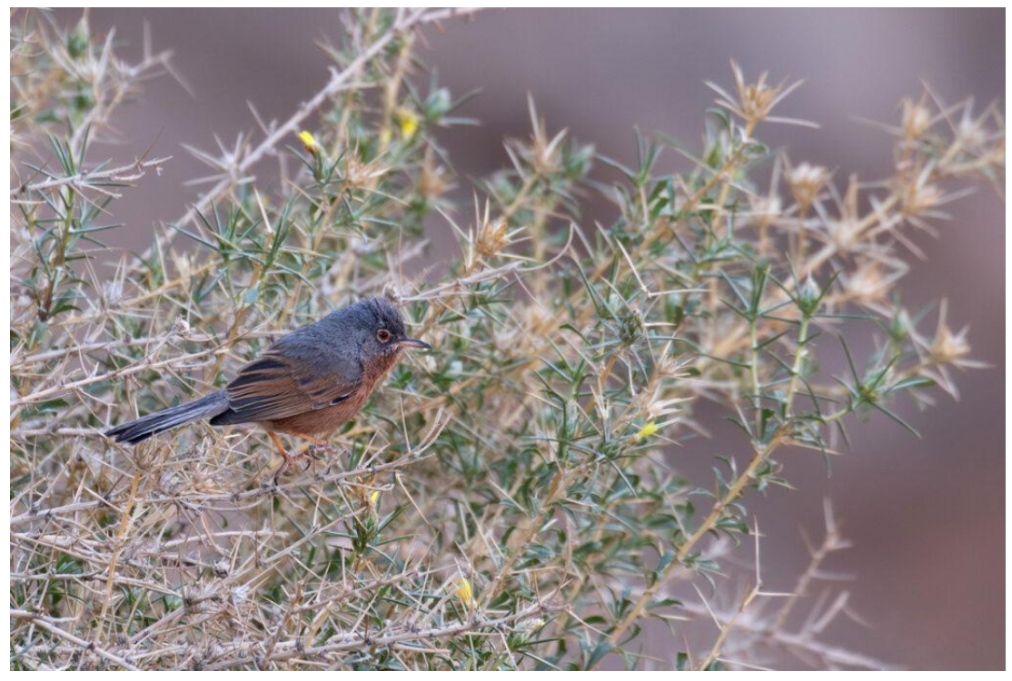
Tristram's Warbler