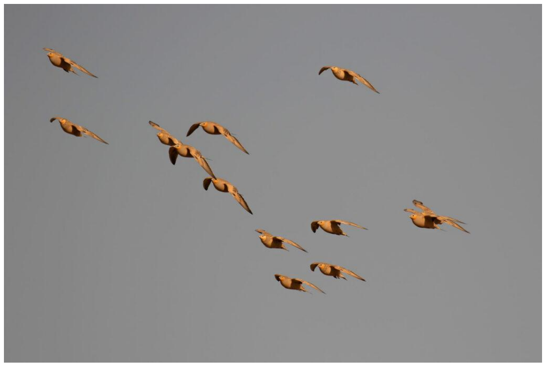
Spotted Sandgrouse