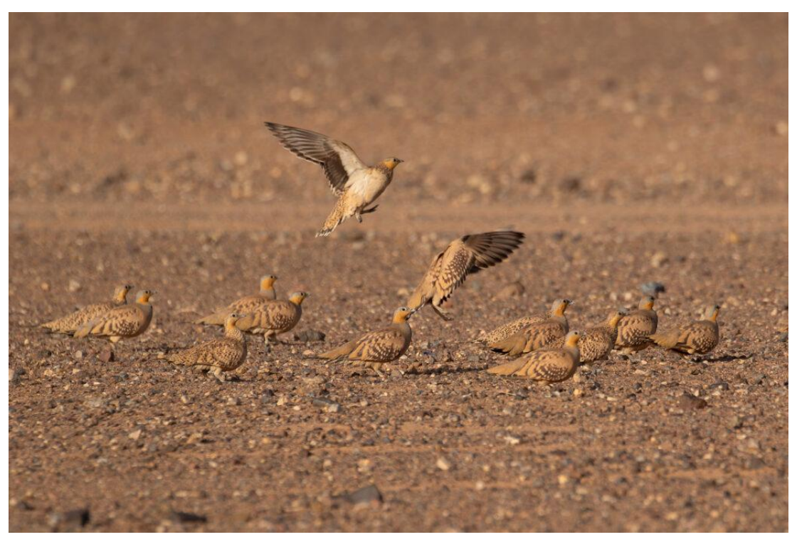
Spotted Sandgrouse