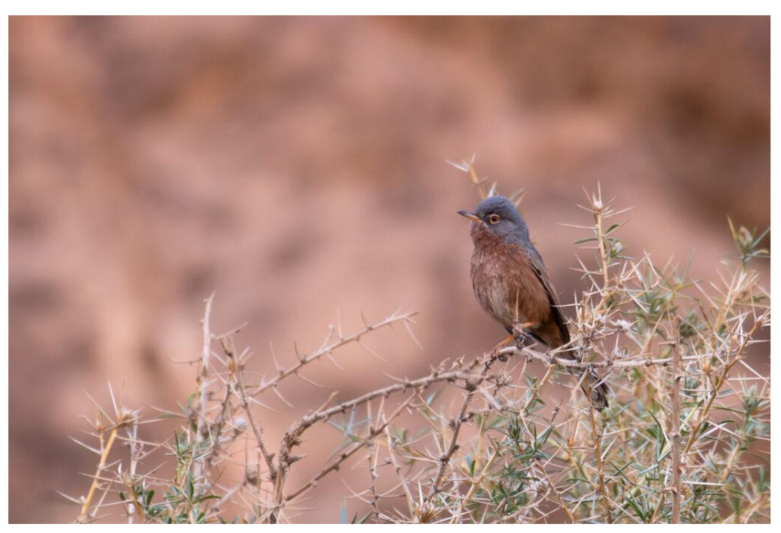
Tristram's Warbler