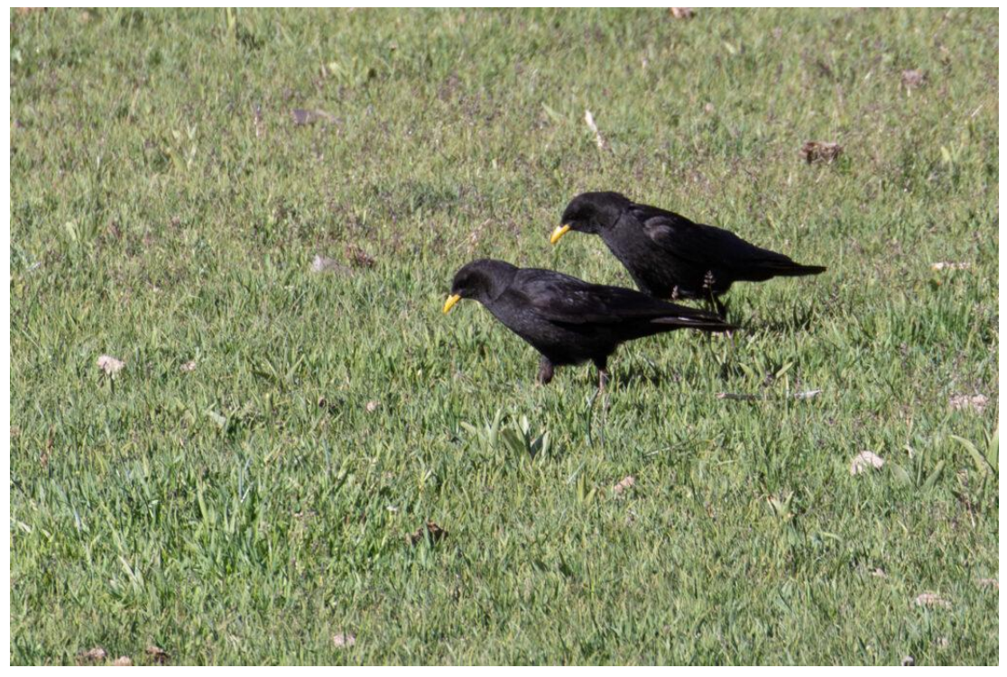
Alpine Choughs