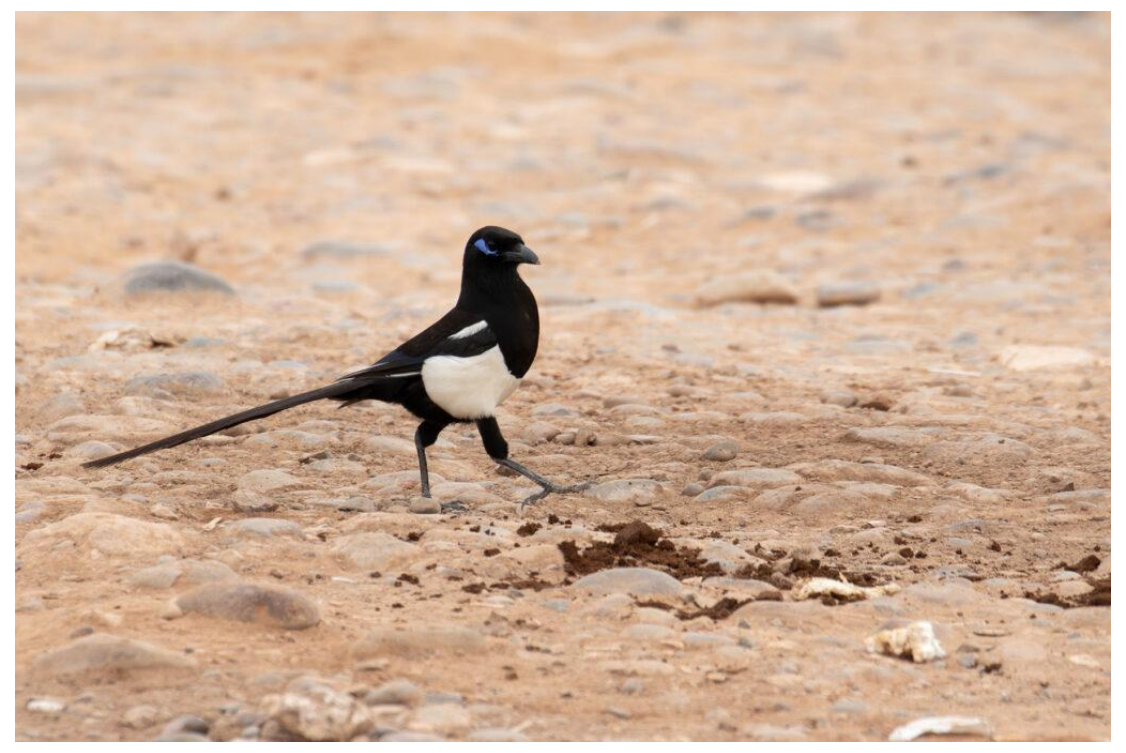
Maghreb Magpie