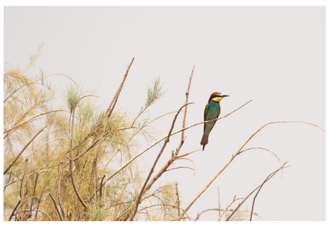
European Bee-eater