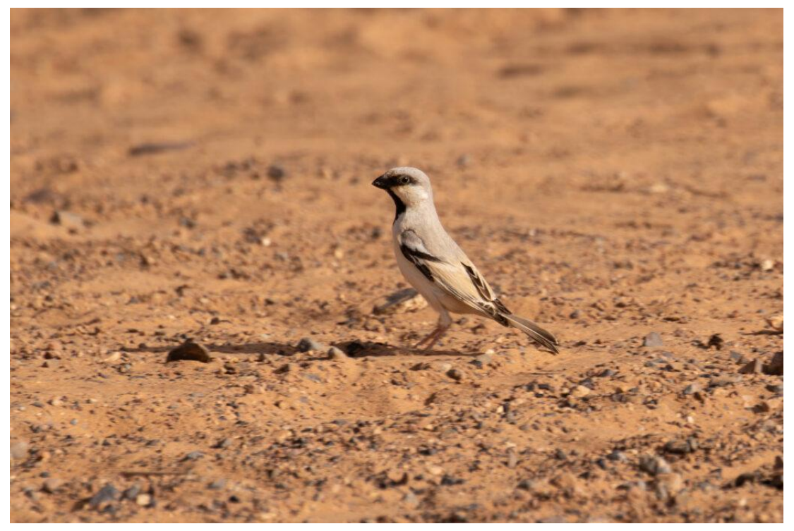
Desert Sparrow