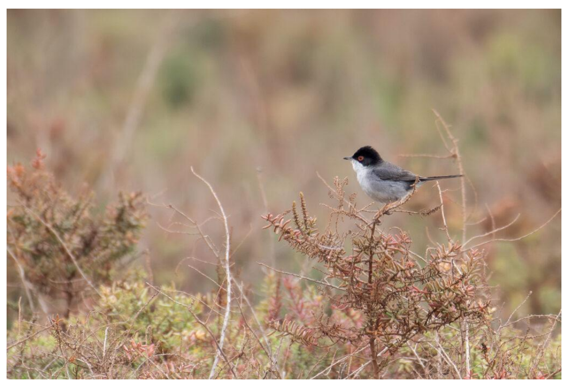
Sardinian Warbler