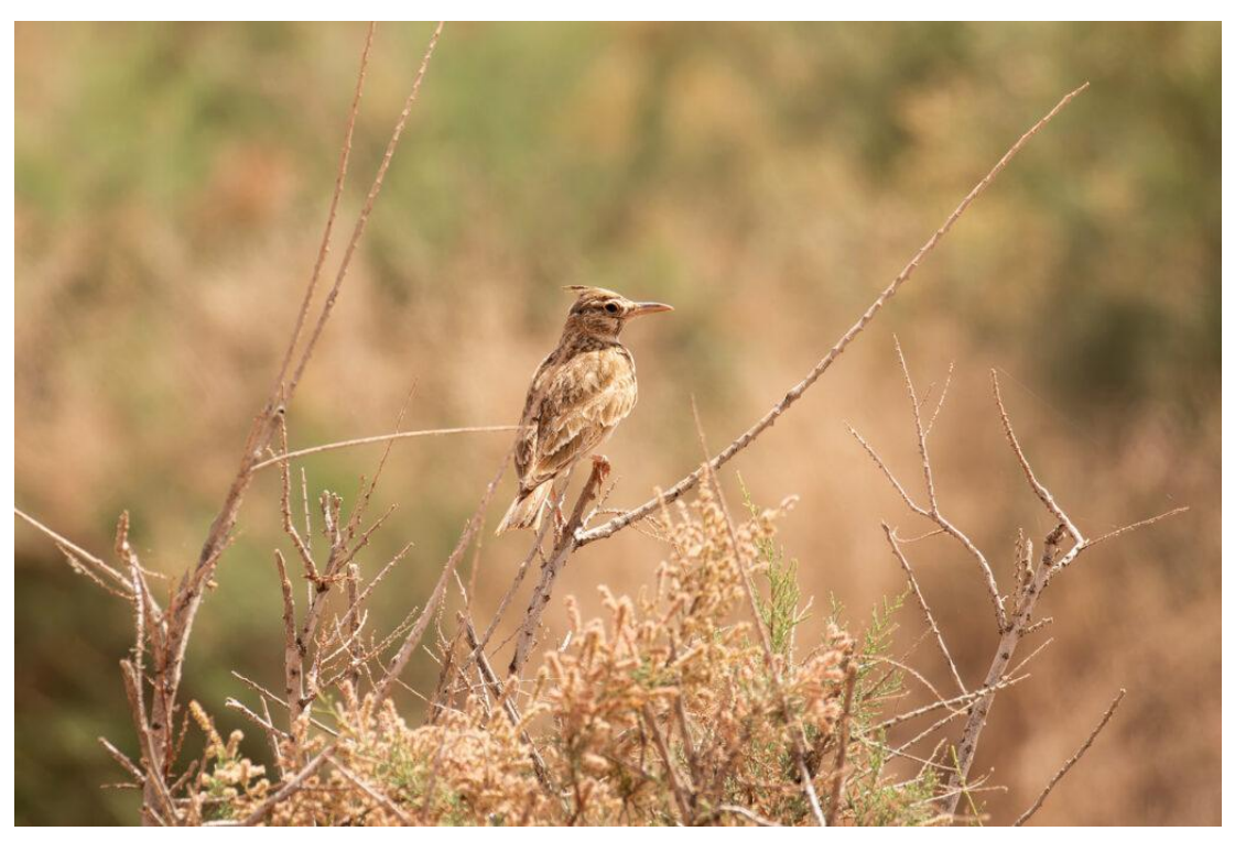
Maghreb Lark