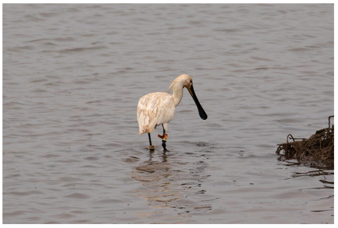
Eurasian Spoonbill