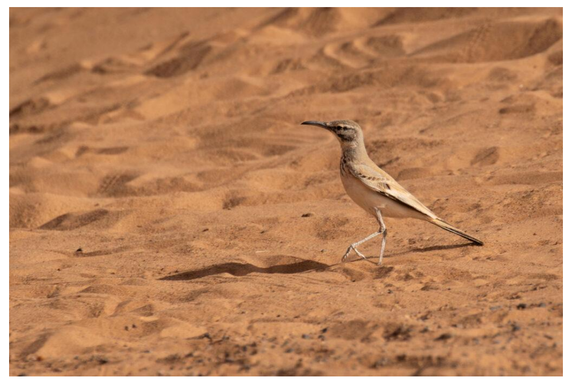
Greater Hoopoe-Lark