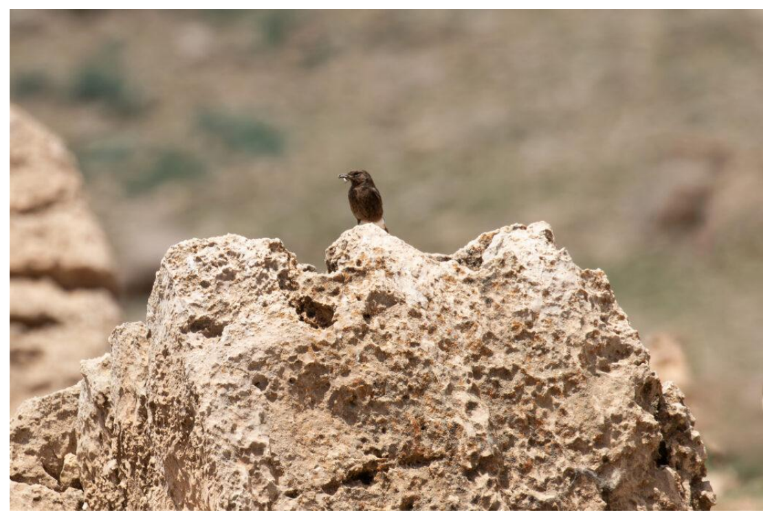
Black Wheatear