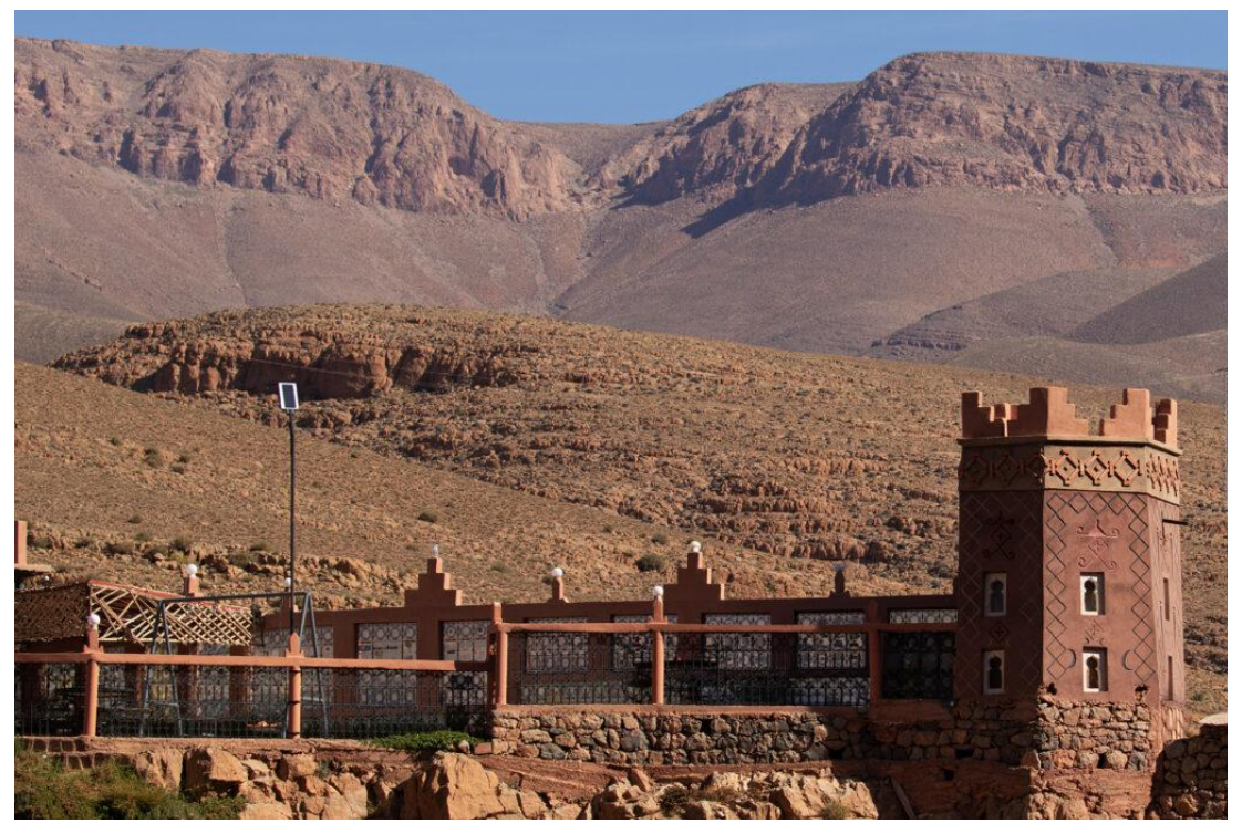
Gorges Dadés