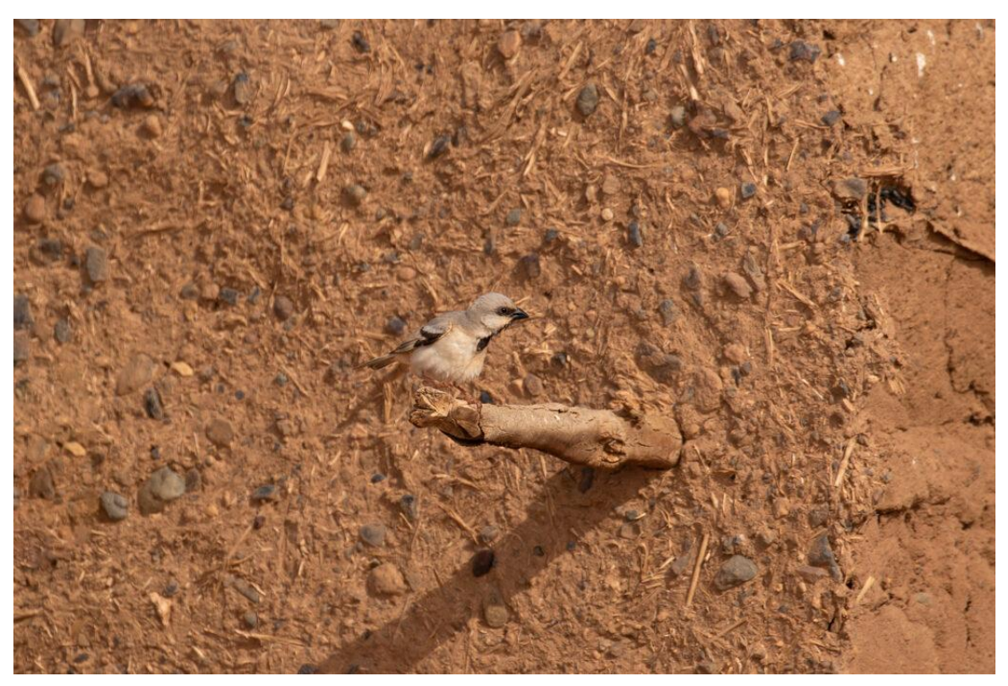
Desert Sparrow