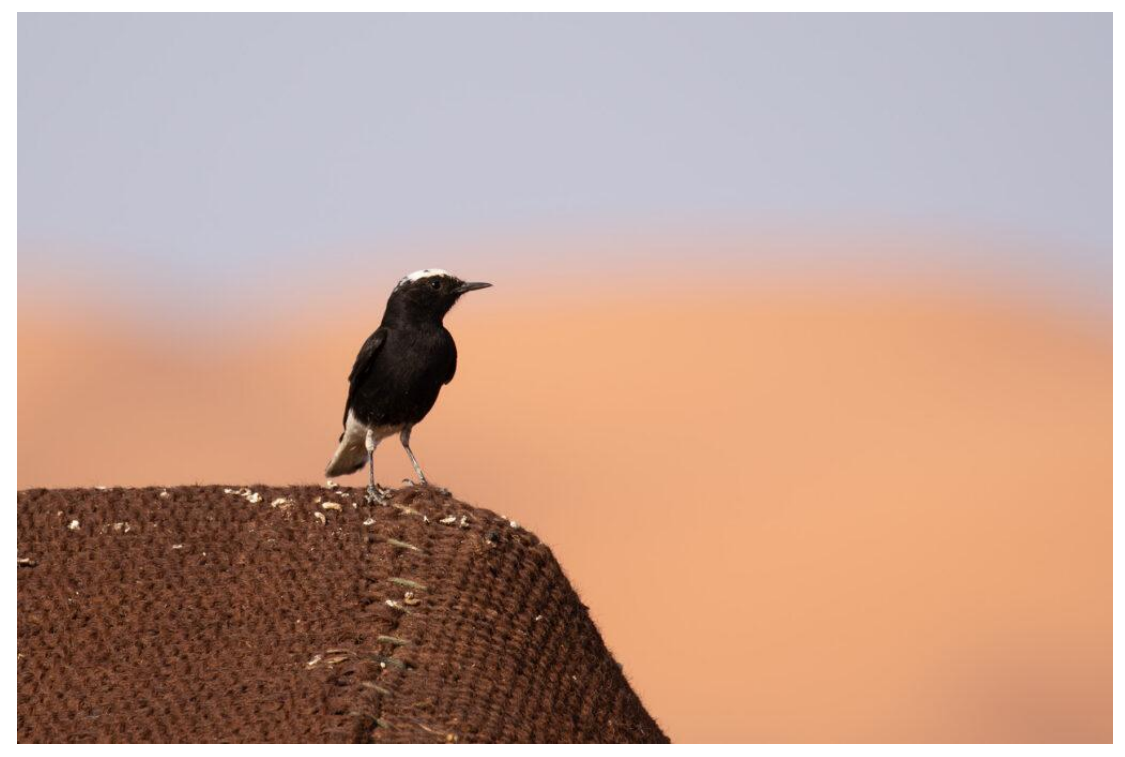
White-crowned Wheatear

Barbary Ground Squirrel (North African G S) Atlantoxerus getulus one enroute from Boumalne to Agadir.