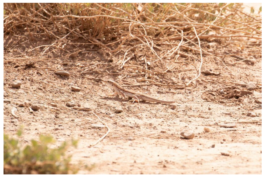
Lizard sp (image by Diedert Koppenol)