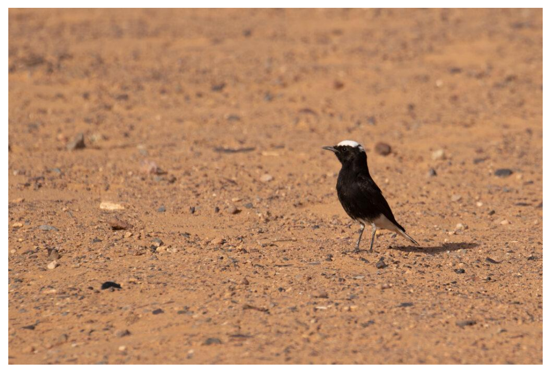
White-crowned Wheatear