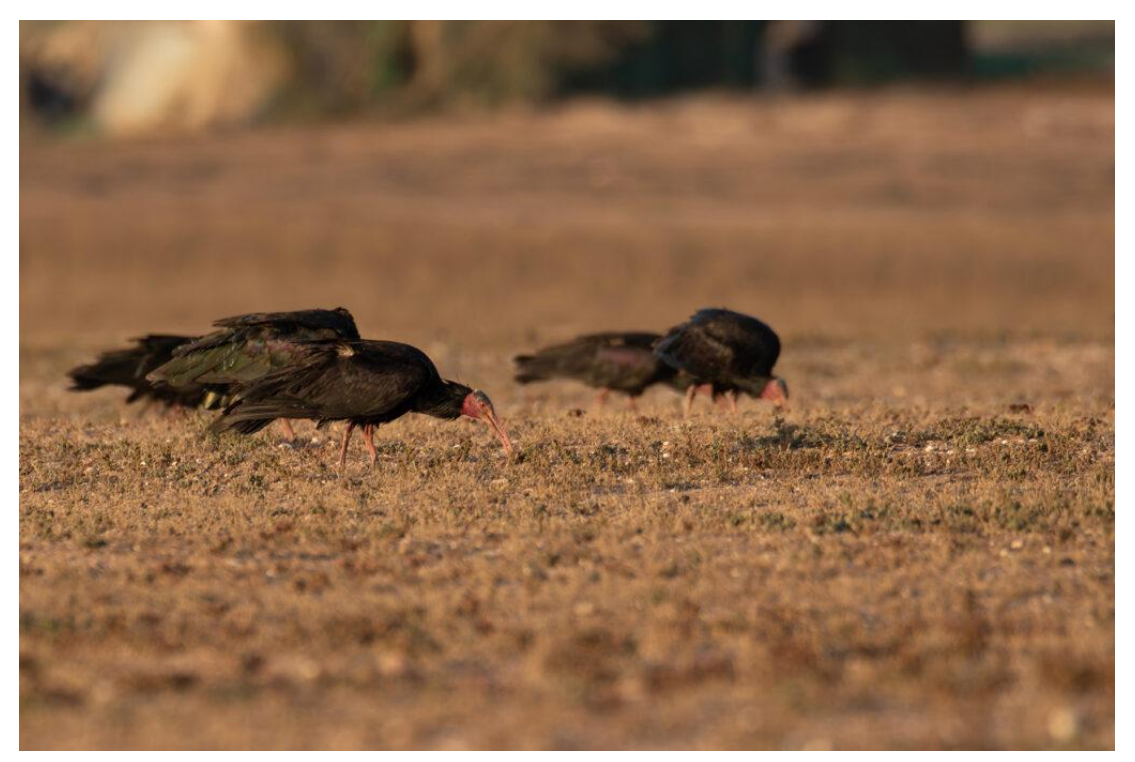
Northern Bald Ibis