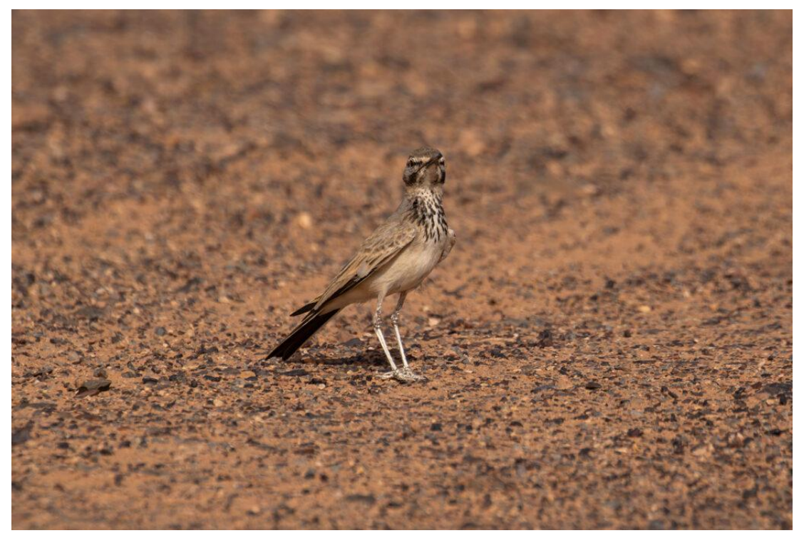
Greater Hoopoe-Lark