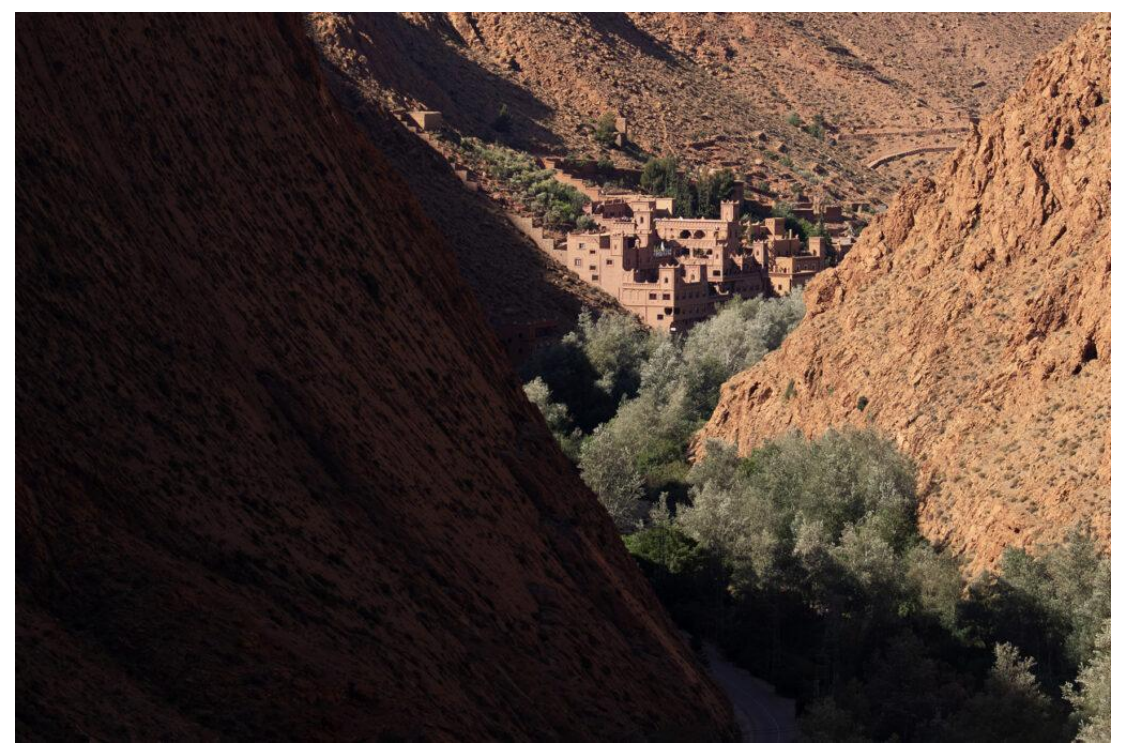
Gorges Dadés