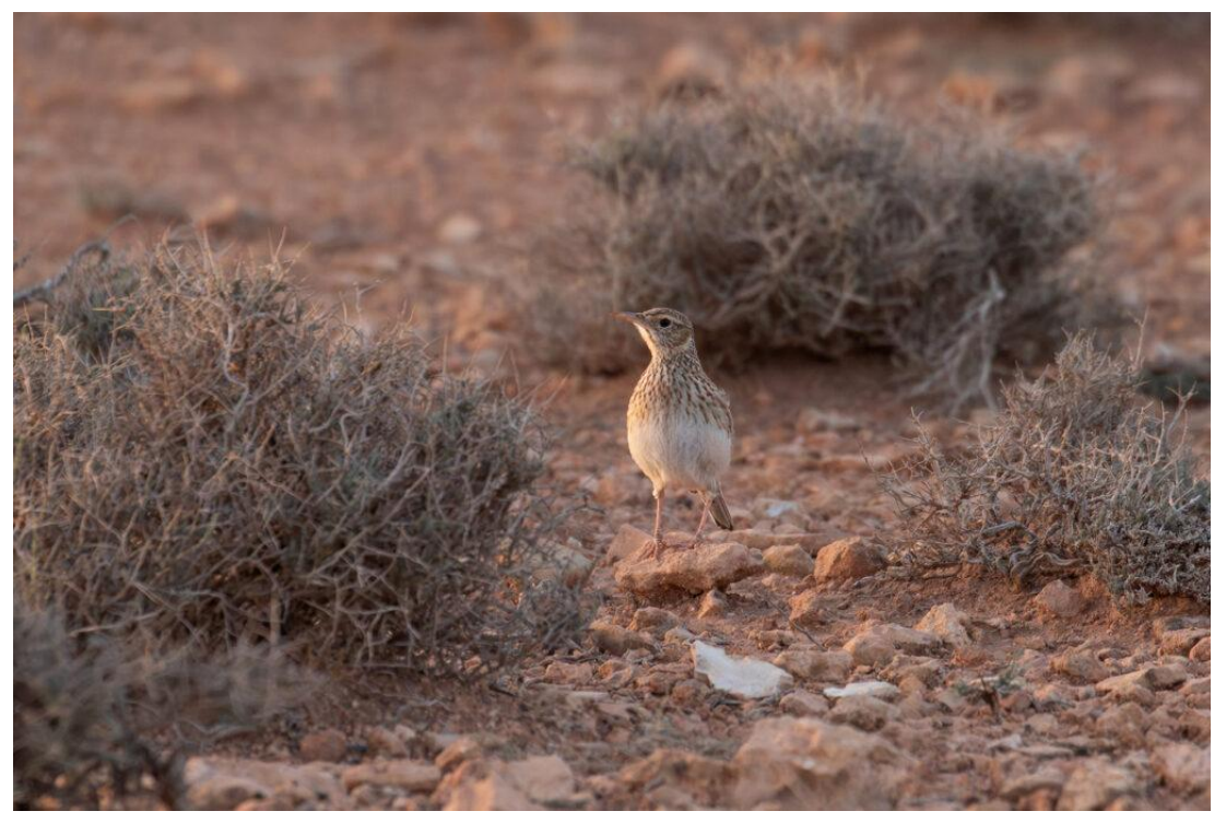
Dupont's Lark (image by Diedert Koppenol)