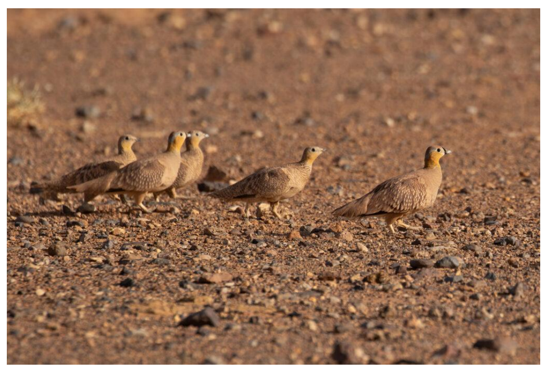
Crowned Sandgrouse