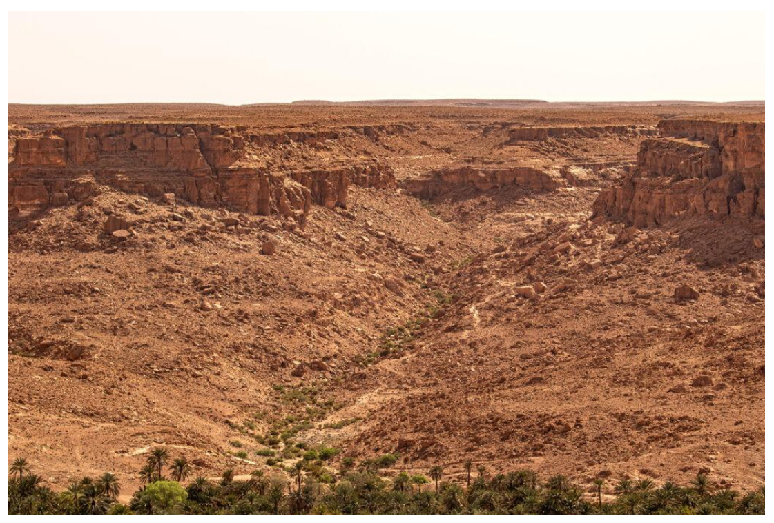
N13 - Midelt