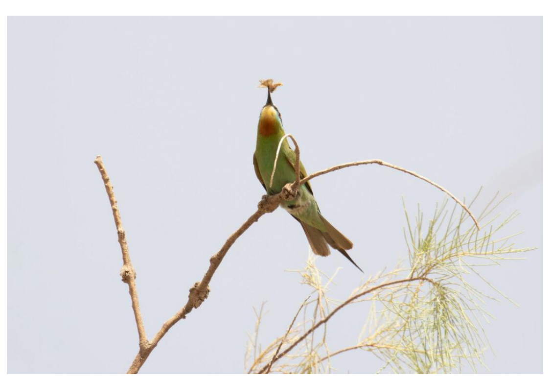
Blue-cheeked Bee-eater