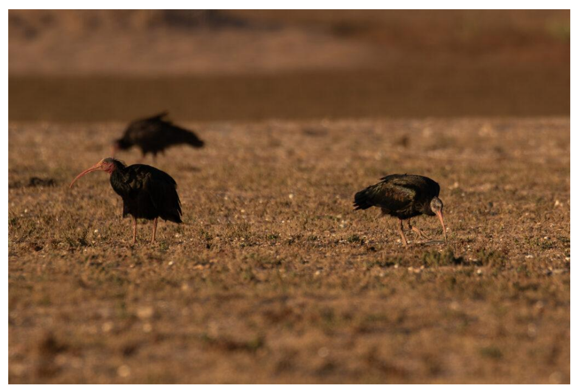
Northern Bald Ibis