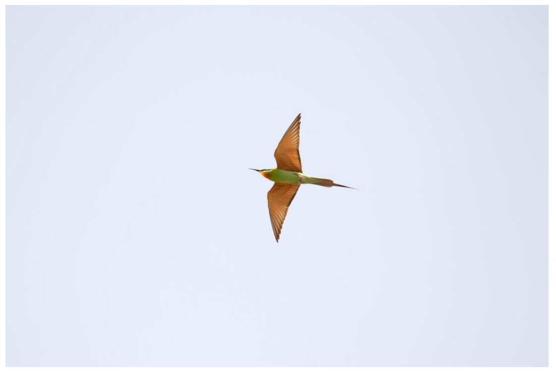
Blue-cheeked Bee-eater