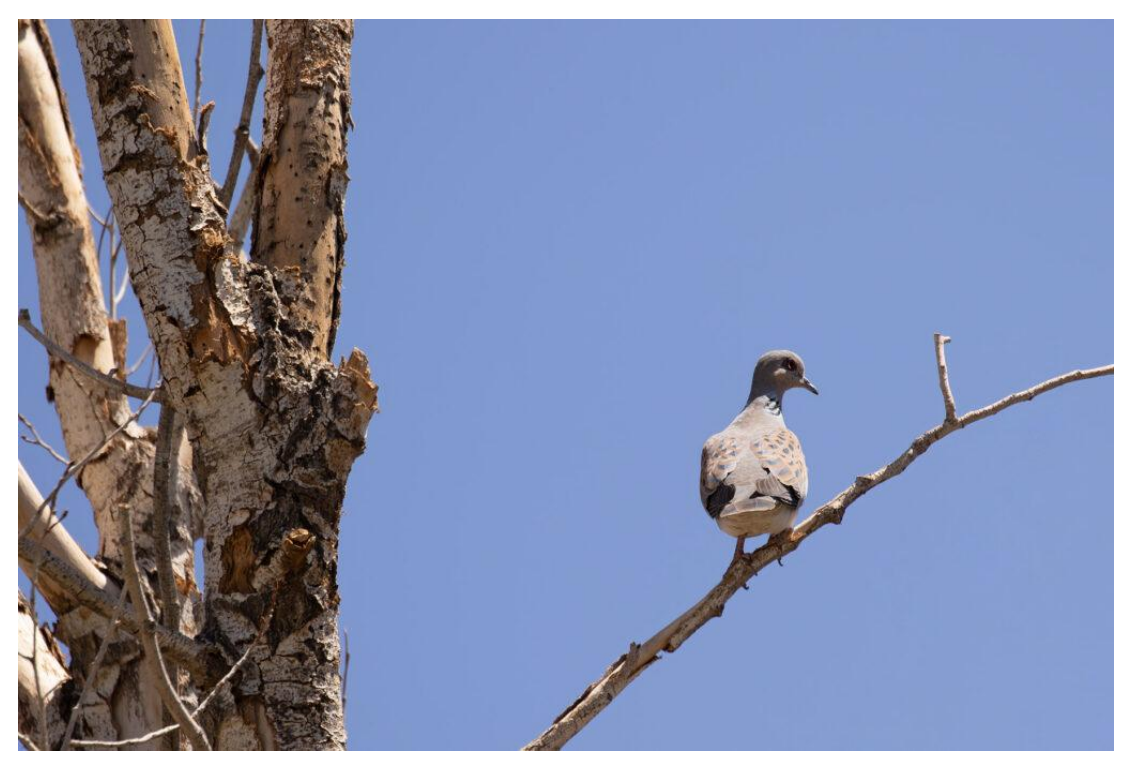
European Turtle Dove (image by Diedert Koppenol)