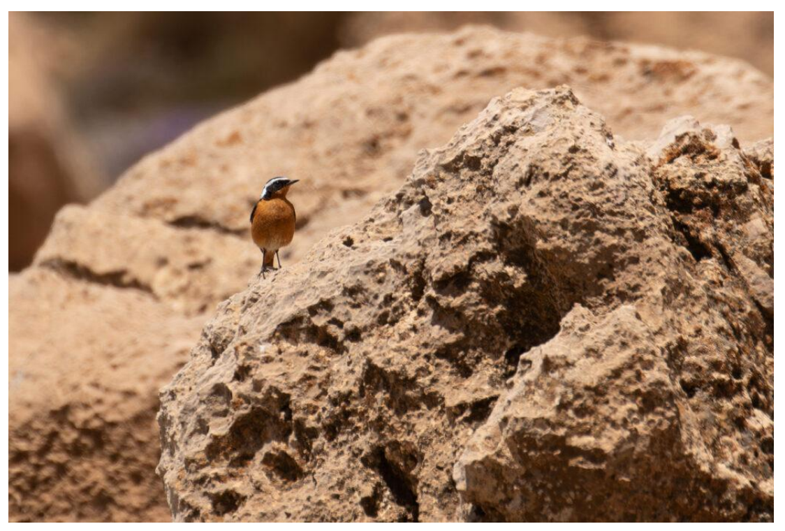
Moussier's Redstart