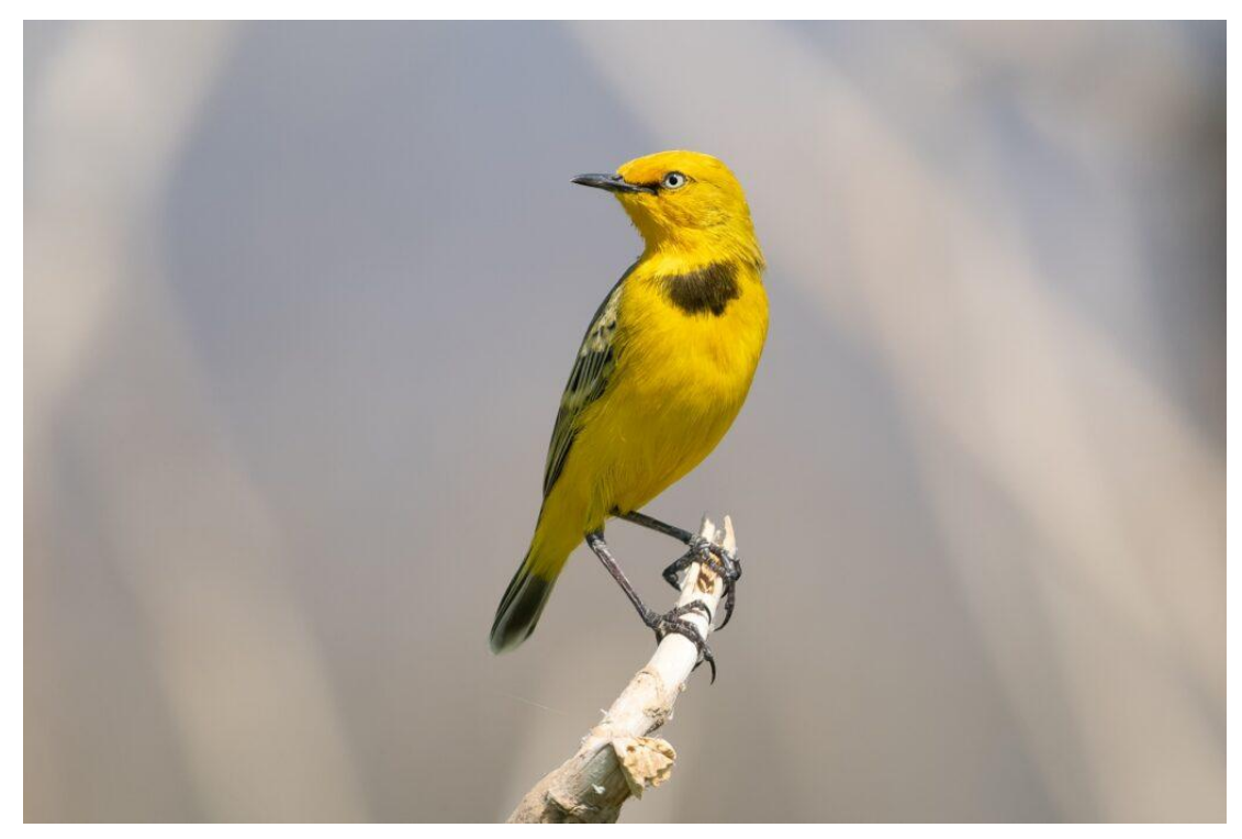
Yellow Chat

Blue Crab Discoplax hirtipes Regularly encountered on Christmas Island.