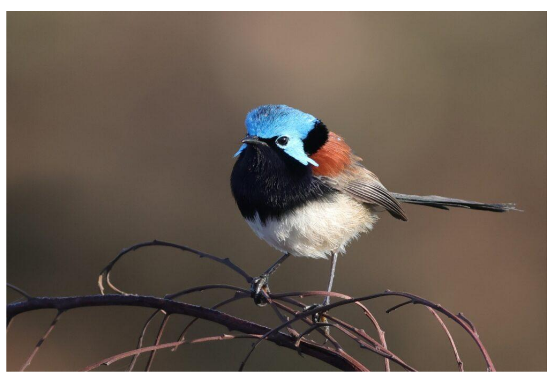
Red-winged Fairywren