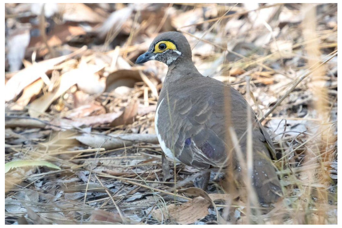
Partridge Pigeon