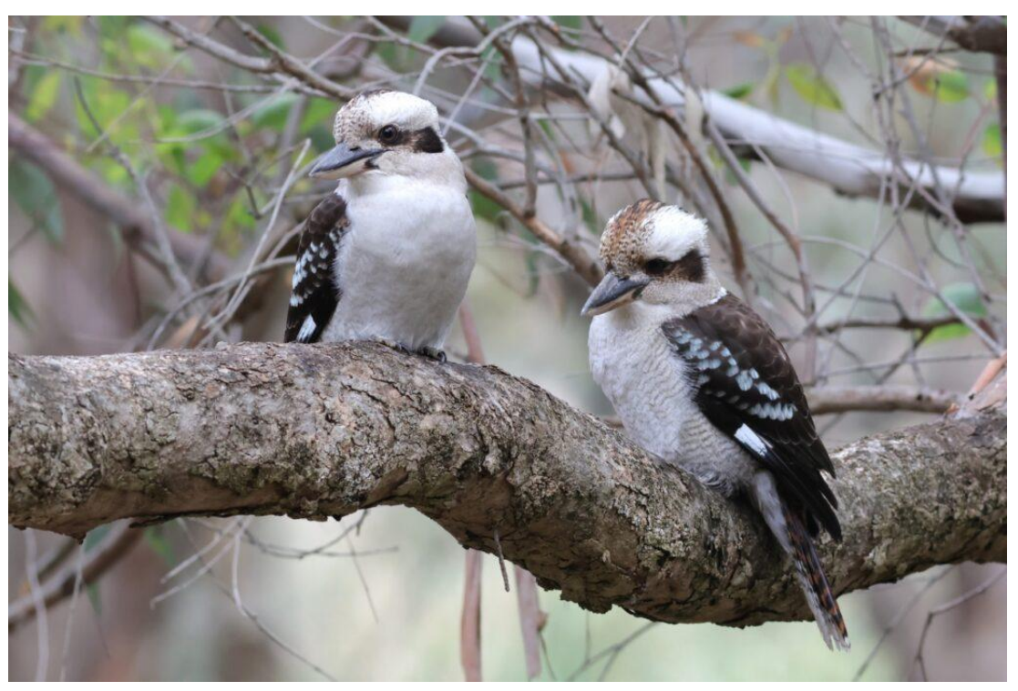
Laughing Kookaburra