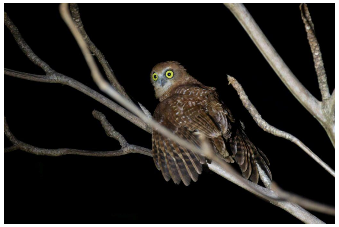
Christmas Boobook