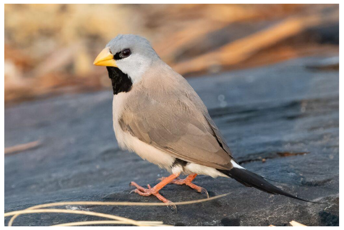
Long-tailed Finch