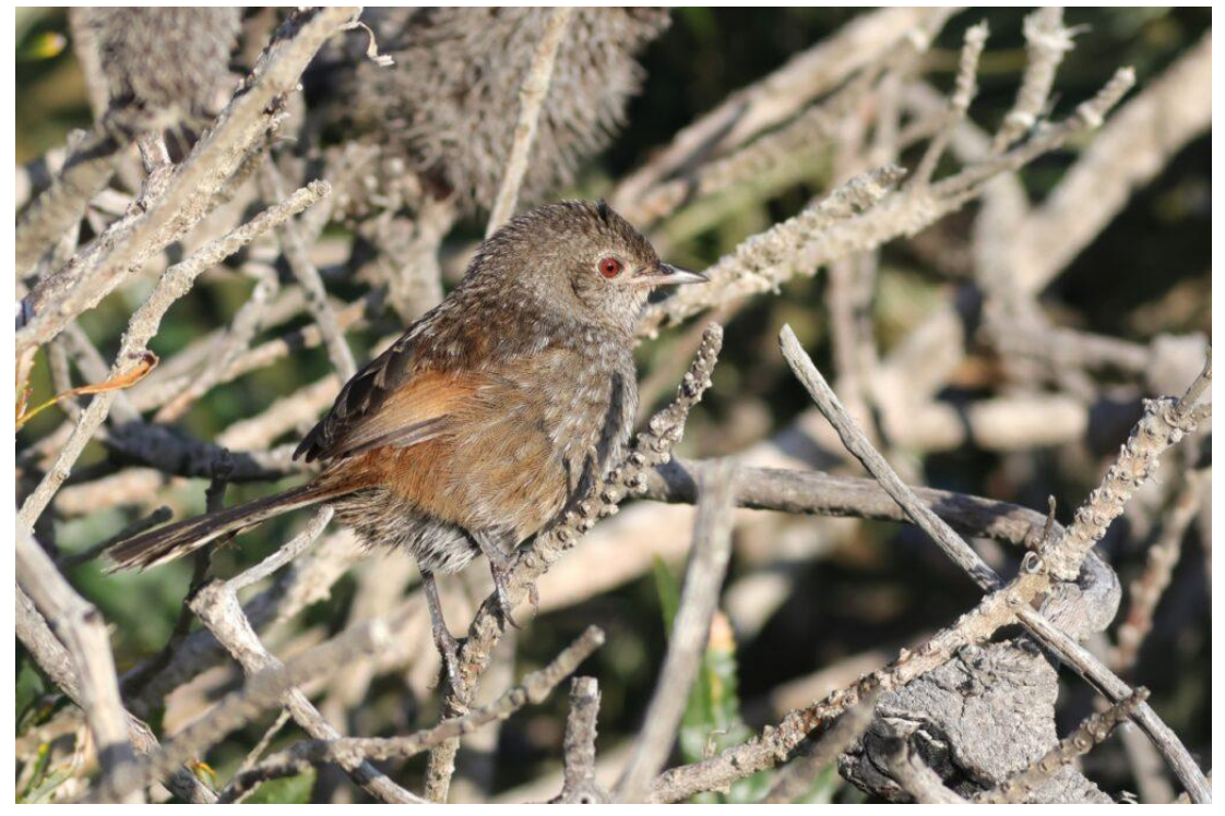
Western Bristlebird