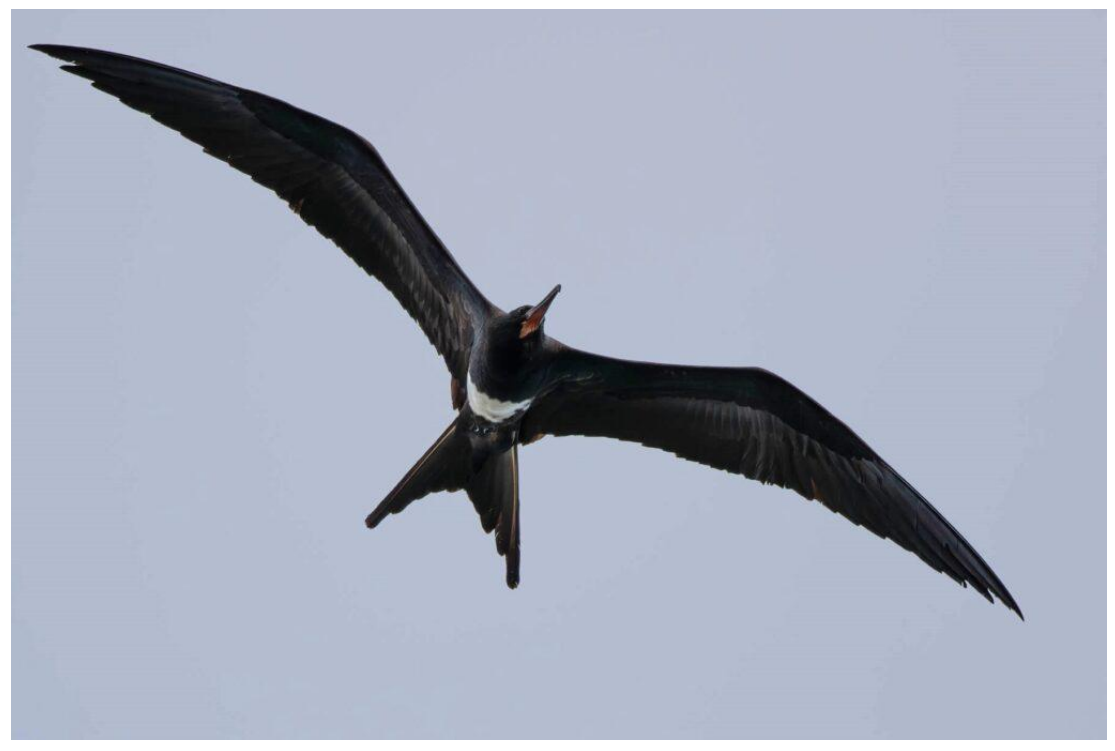
Christmas Island Frigatebird