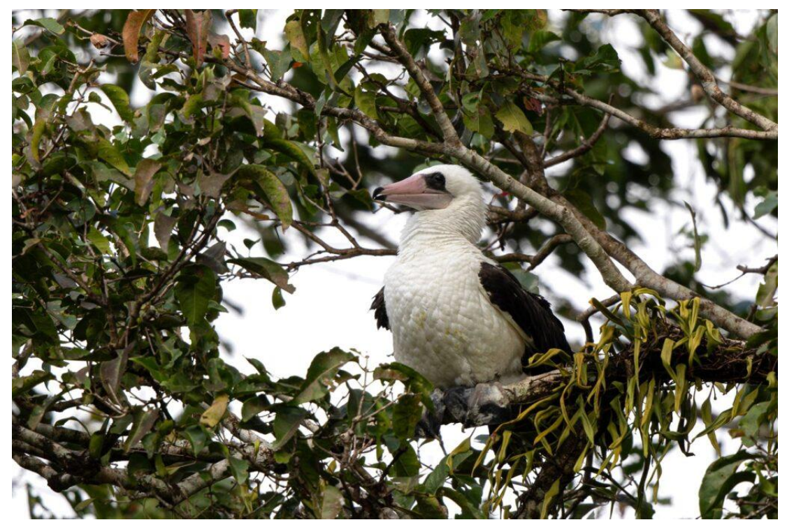
Abbot's Booby