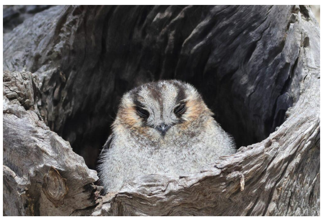
Australian Owlet-nightjar