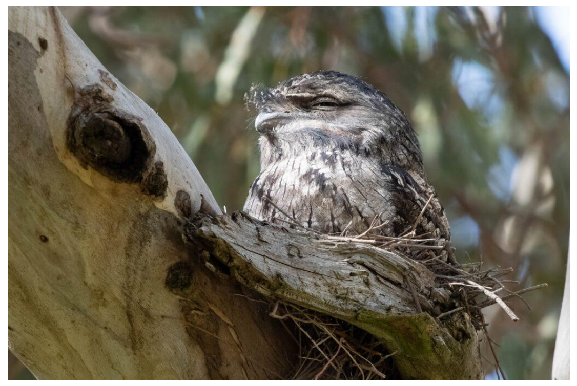
Tawny Frogmouth