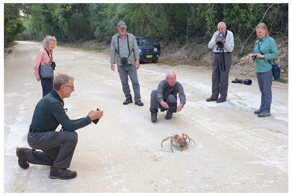
Robber Crab