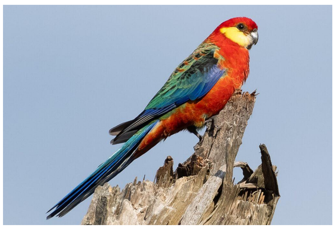
Western Rosella