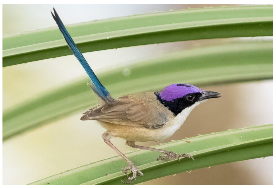
Purple-crowned Fairywren