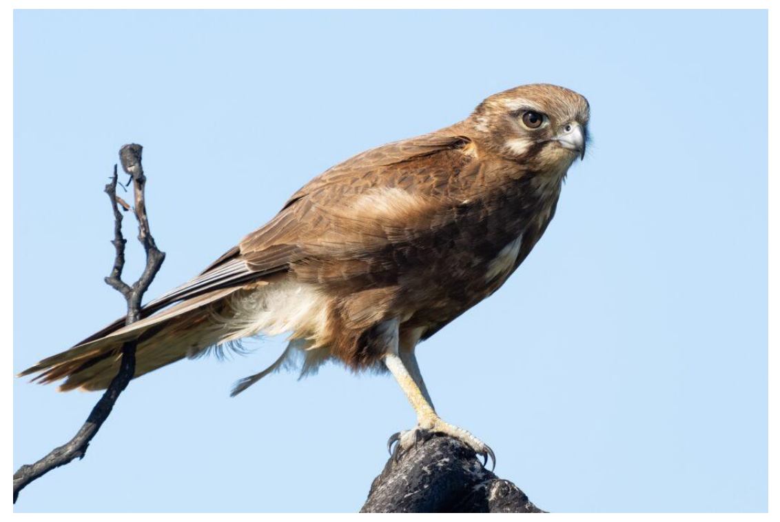
Brown Falcon