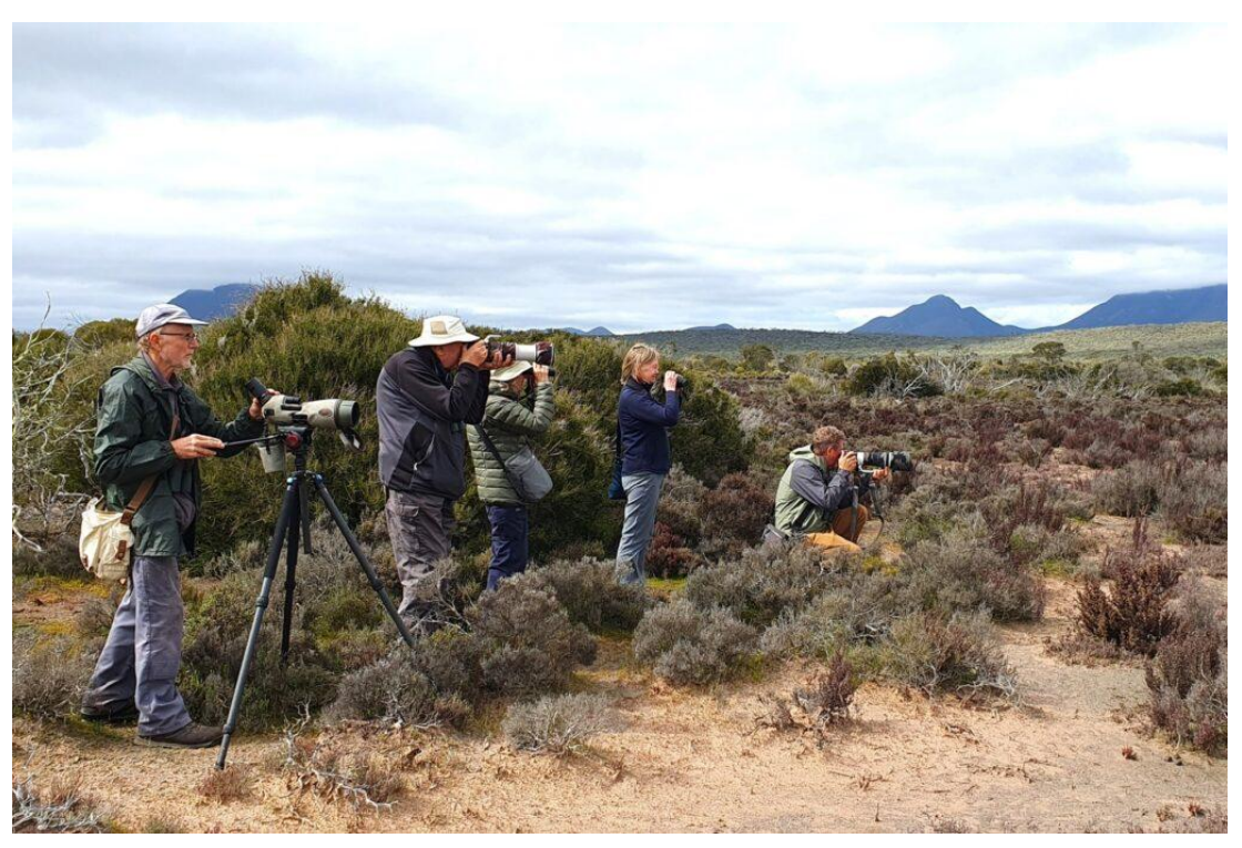
Birding at Mount Trio