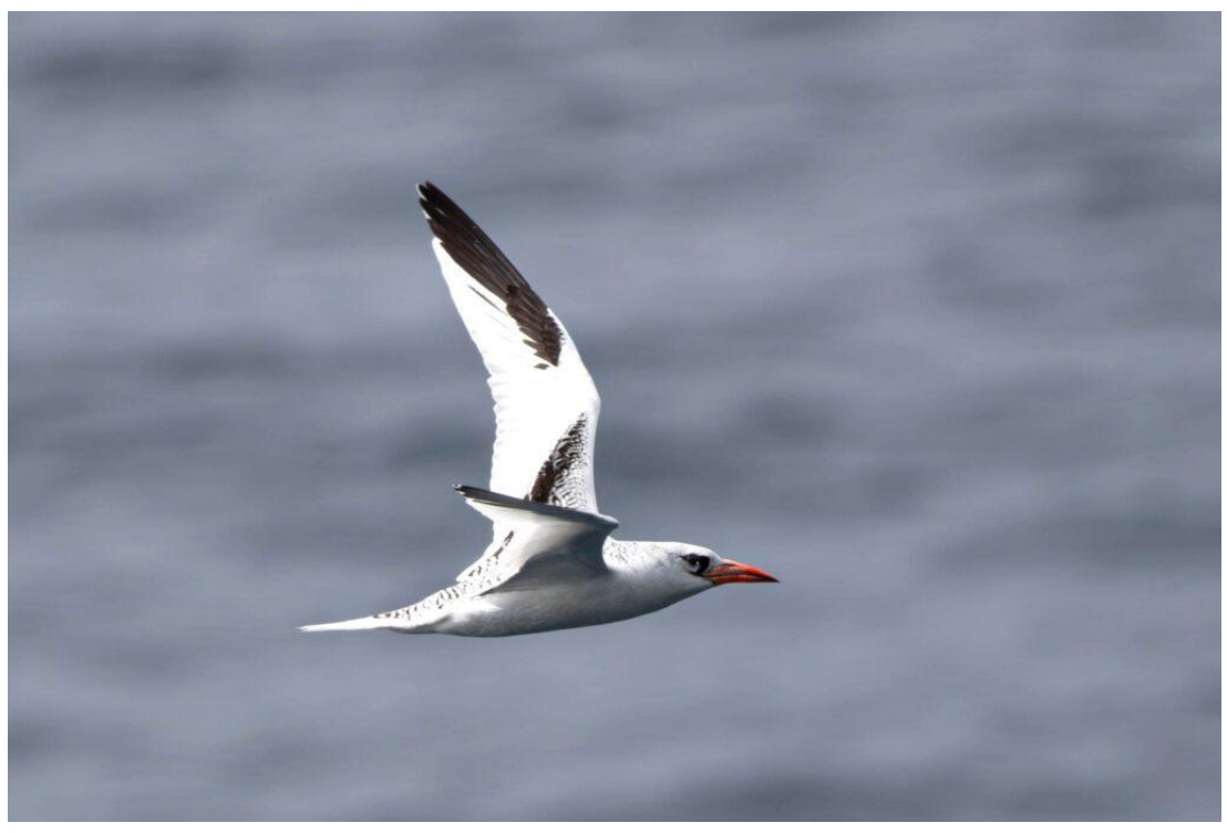
Red-billed Tropicbird