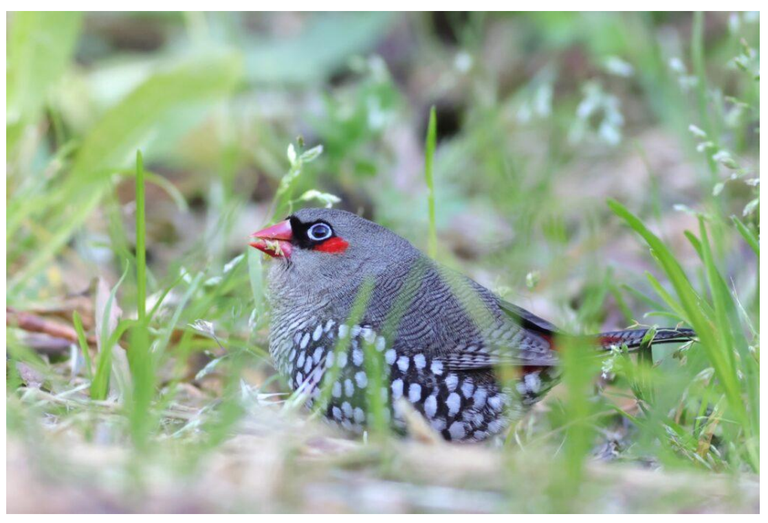
Red-eared Firetail