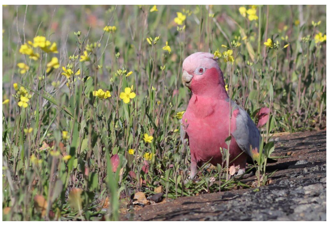
Galah