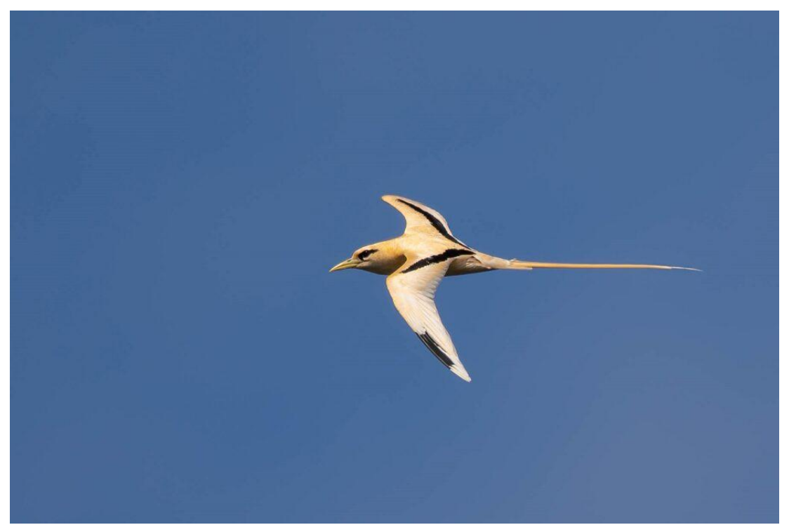
White-tailed Tropicbird