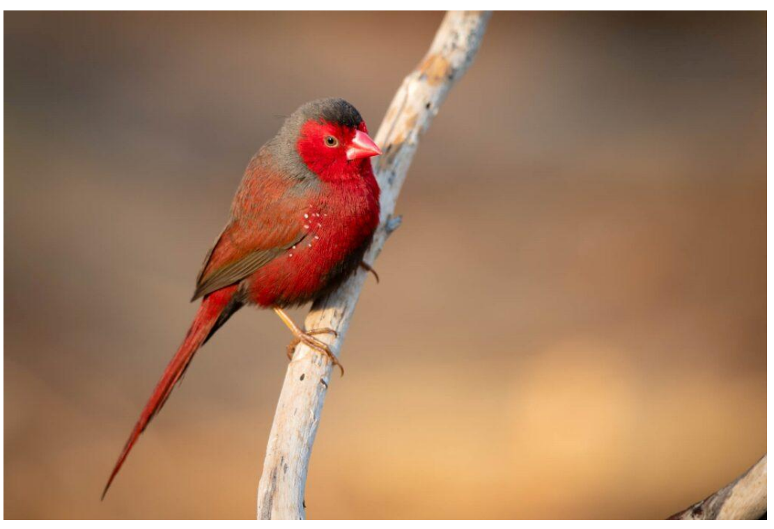
Crimson Finch