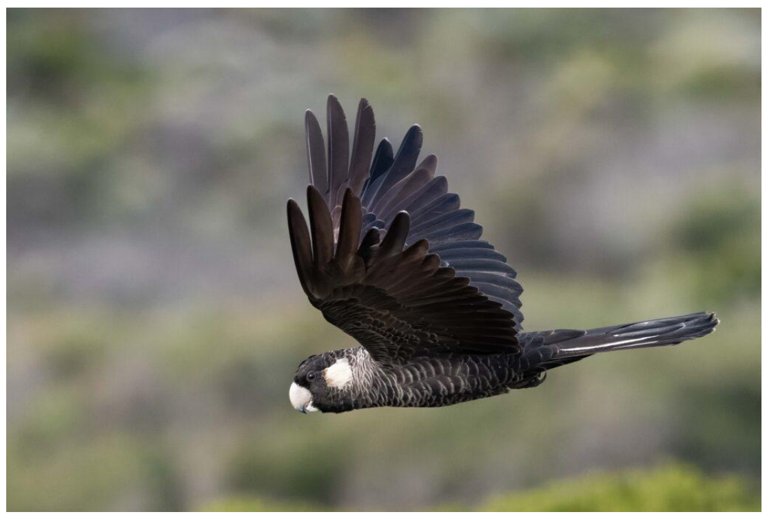
Carnaby's Black Cockatoo