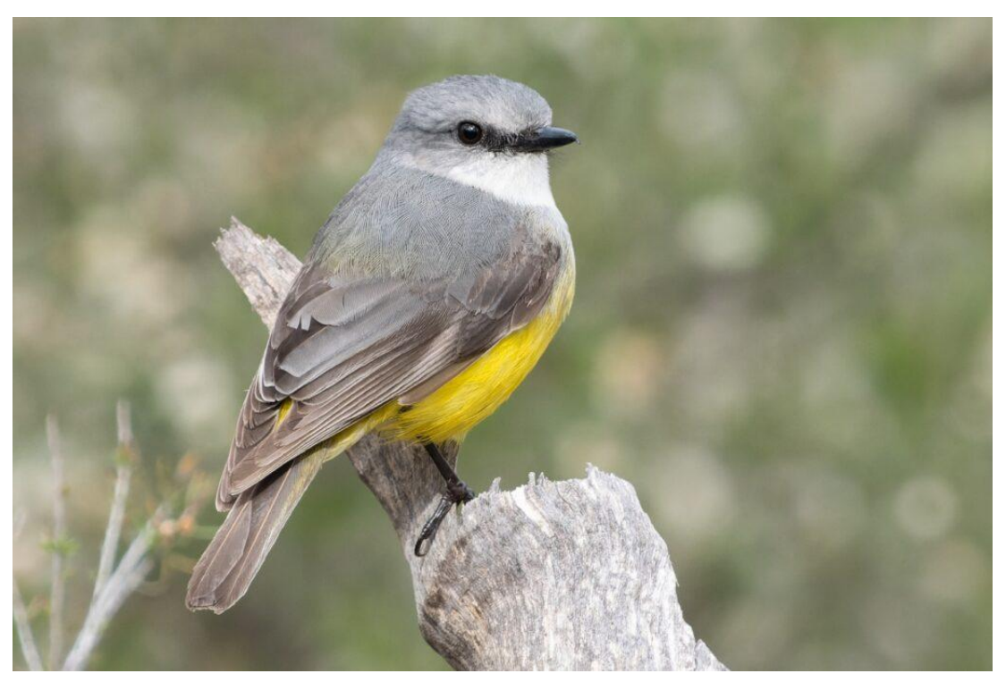
Western Yellow Robin