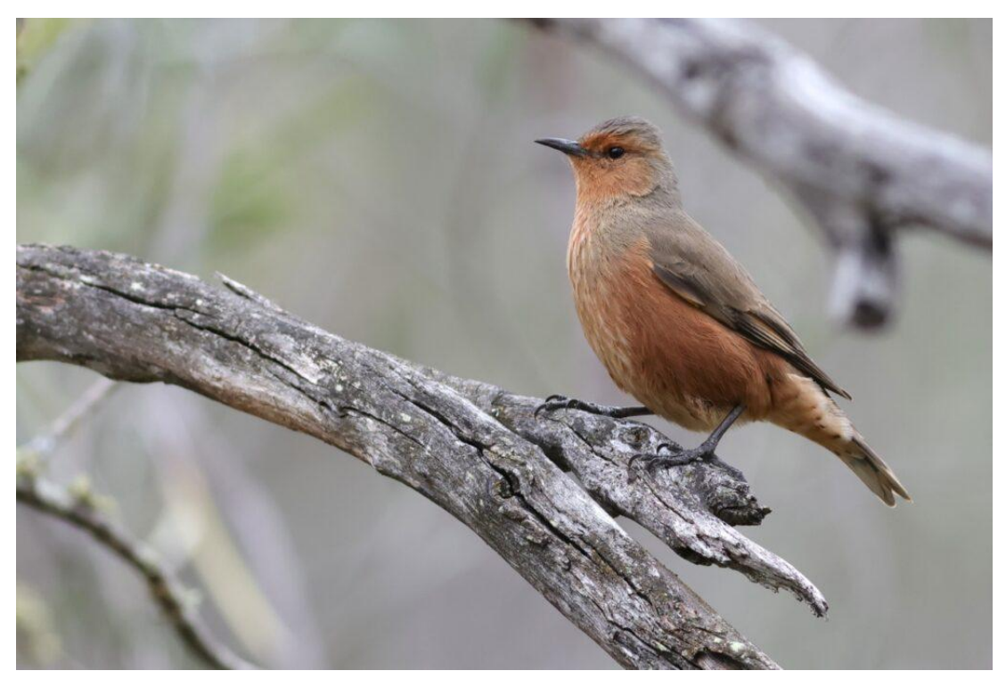
Rufous Treecreeper