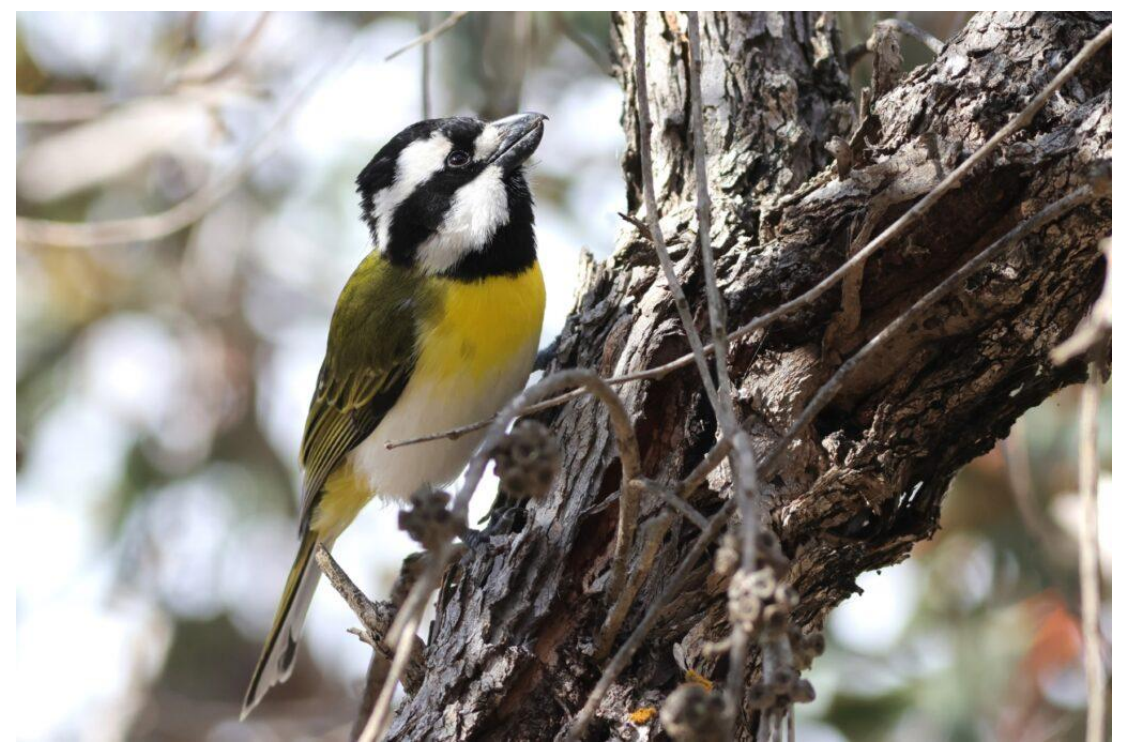
Western Shriketit