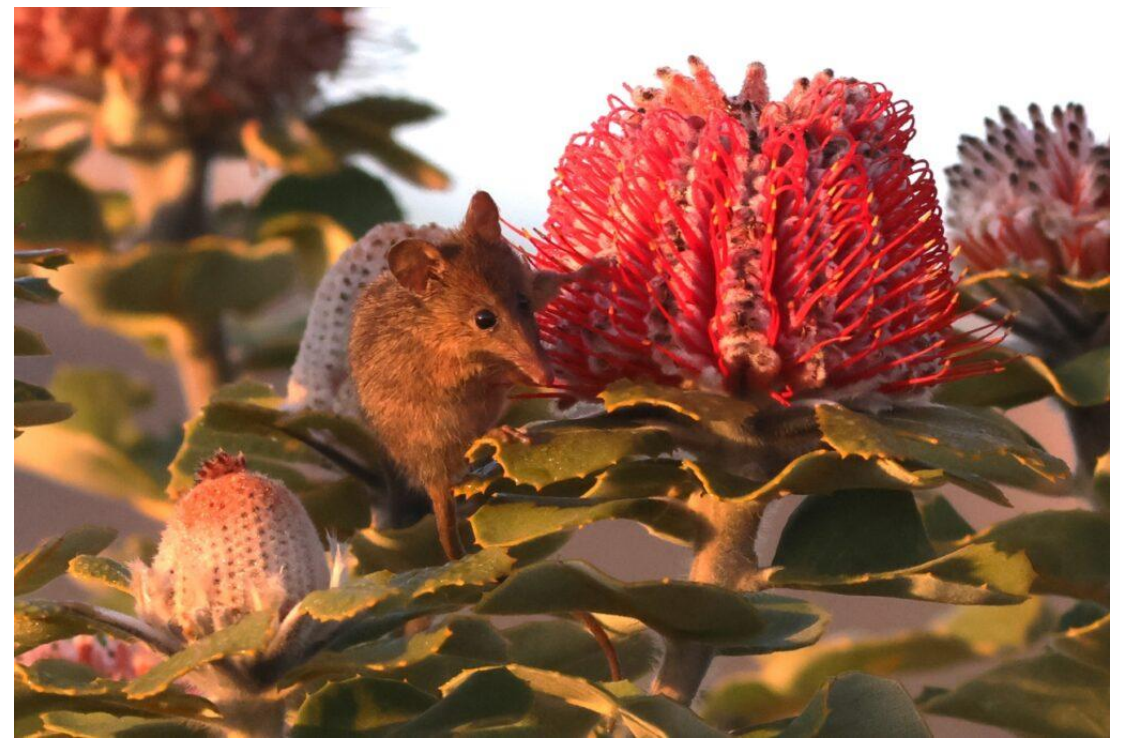
Honey Possum