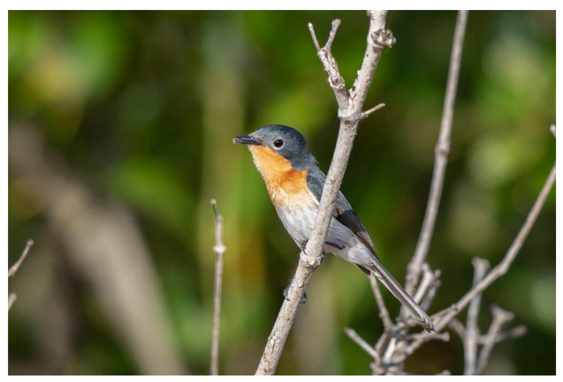
Broad-billed Flycatcher