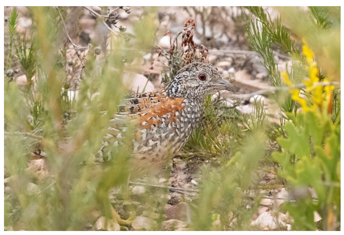
Painted Buttonquail