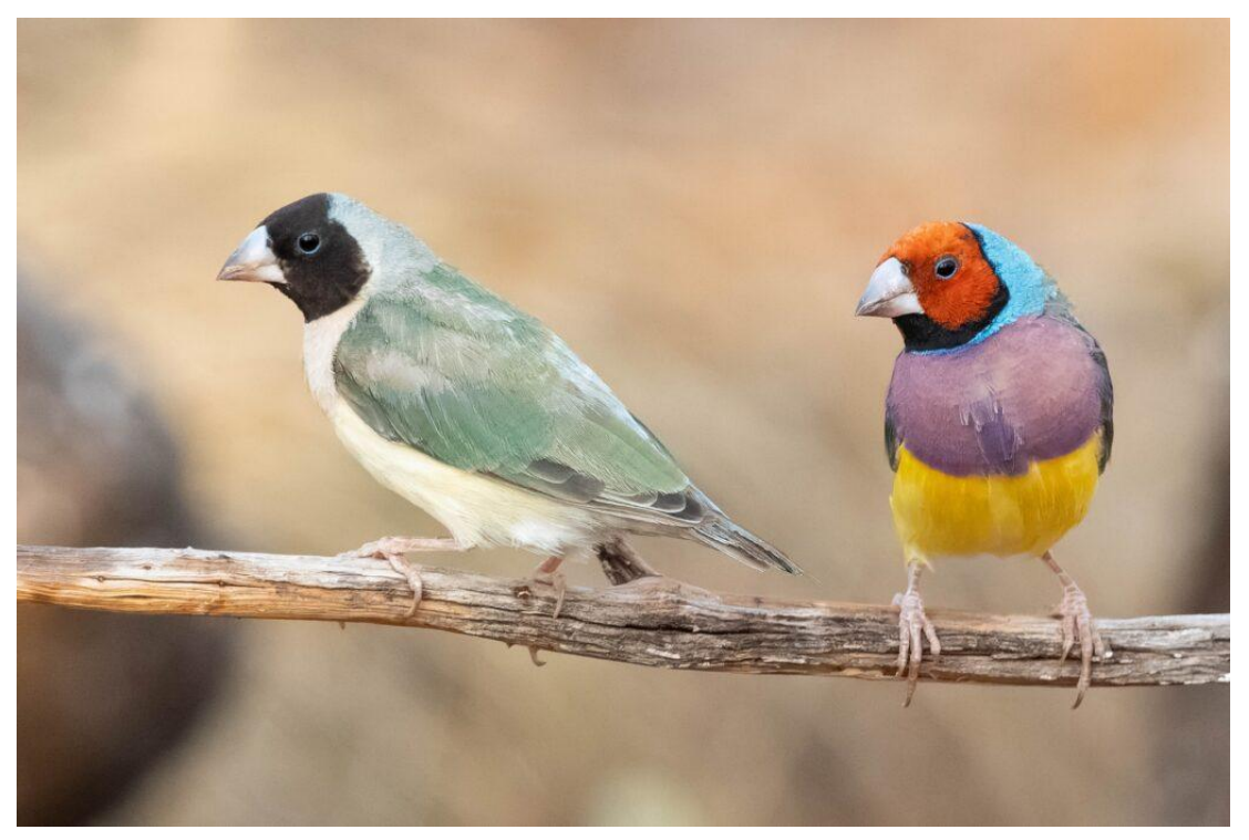
Gouldian Finch