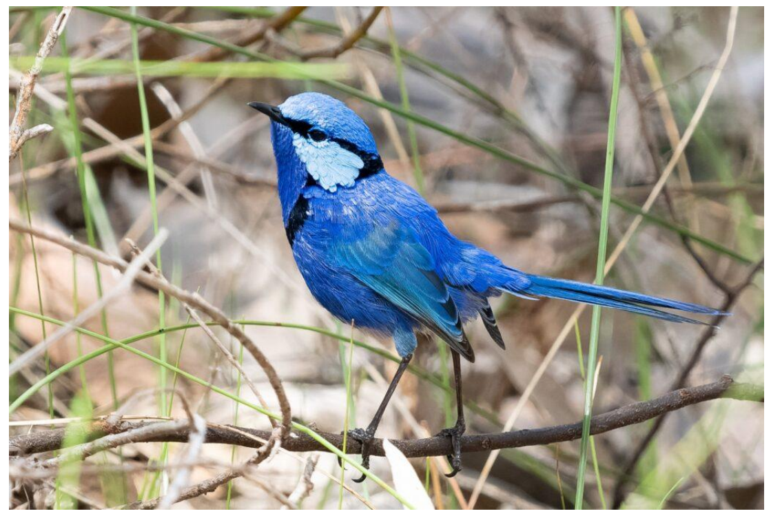
Splendid Fairywren