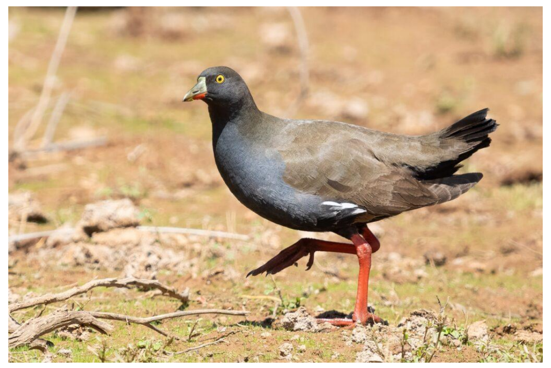
Native Bushhen