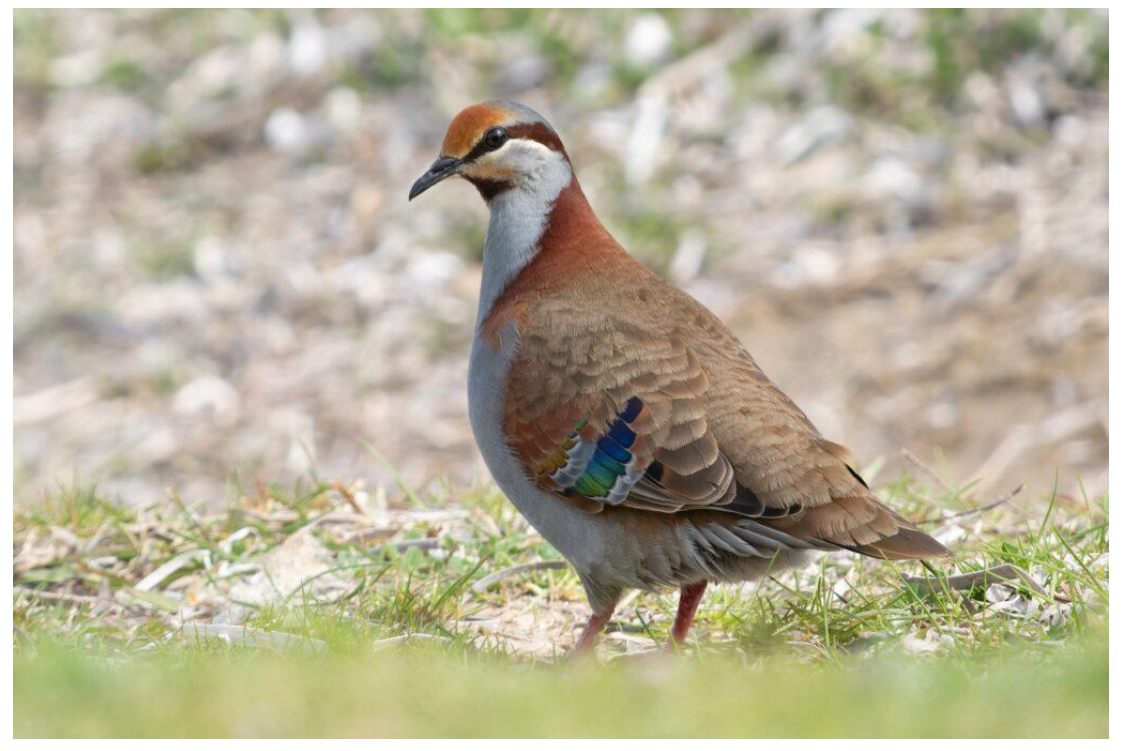
Brush Bronzewing