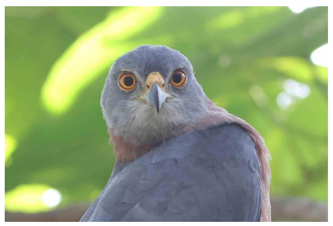
Brown Goshawk