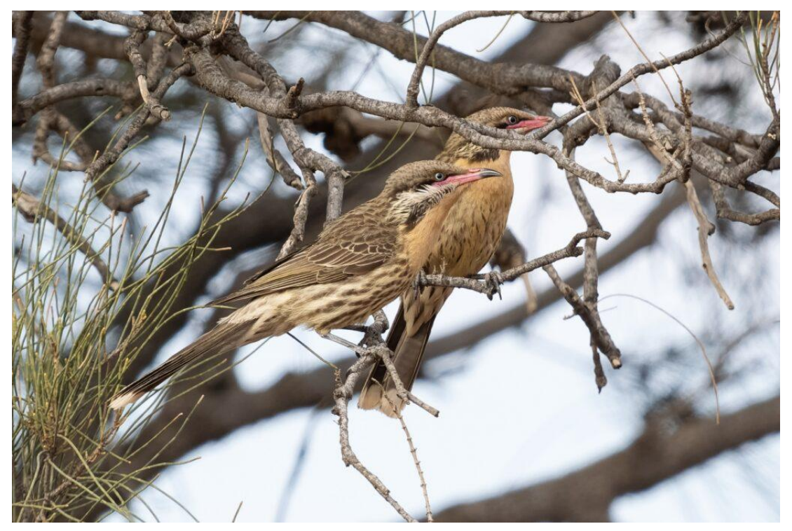
Spiny-cheeked Honeyeater