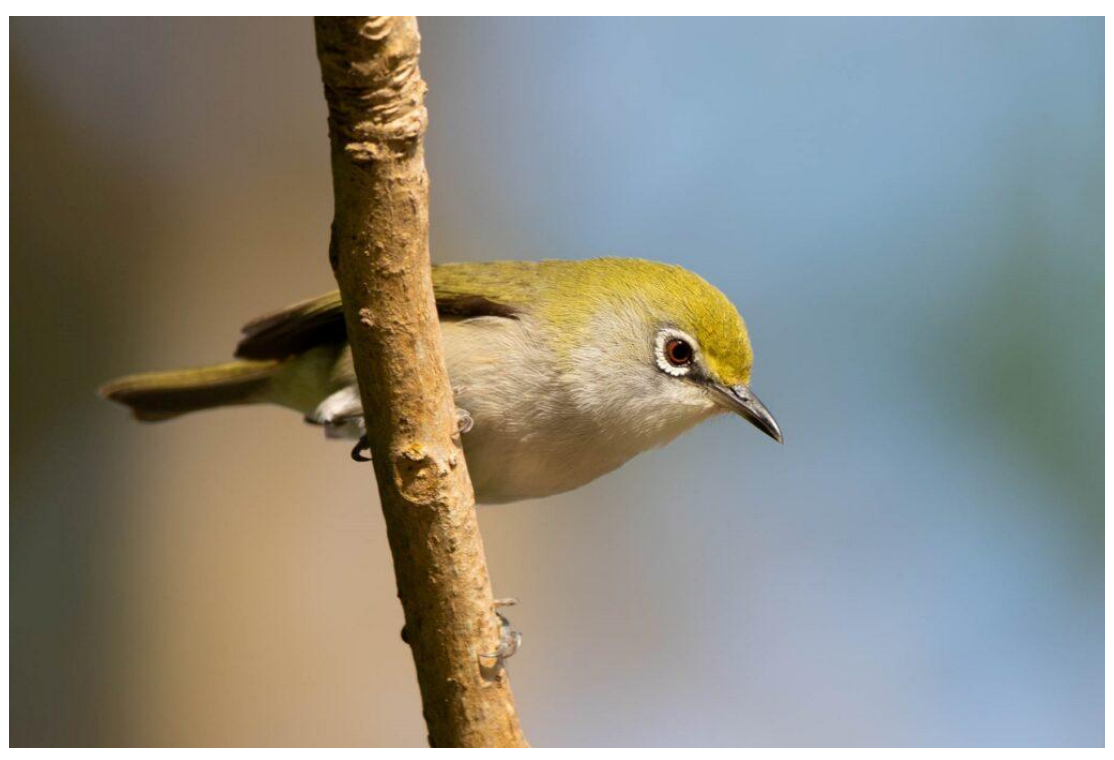
Christmas White-eye