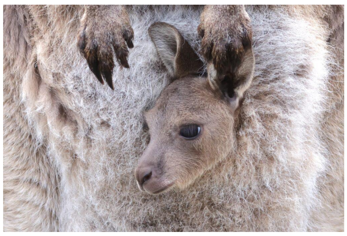
Western Grey Kangaroo