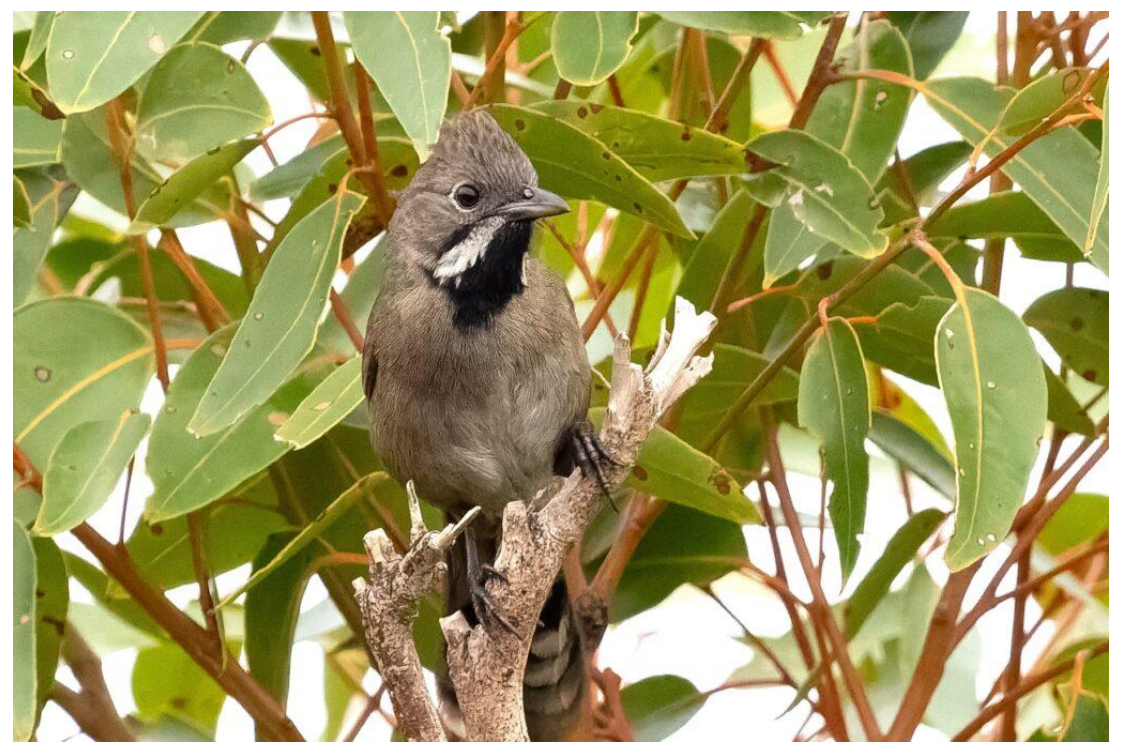
Black-throated Whipbird