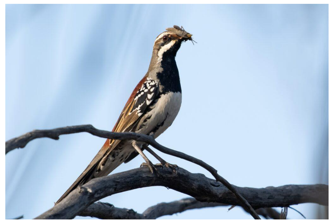
Copperback Quail-thrush