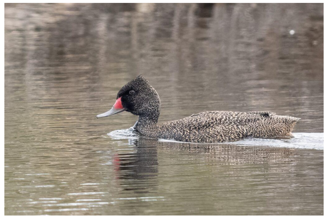
Freckled Duck