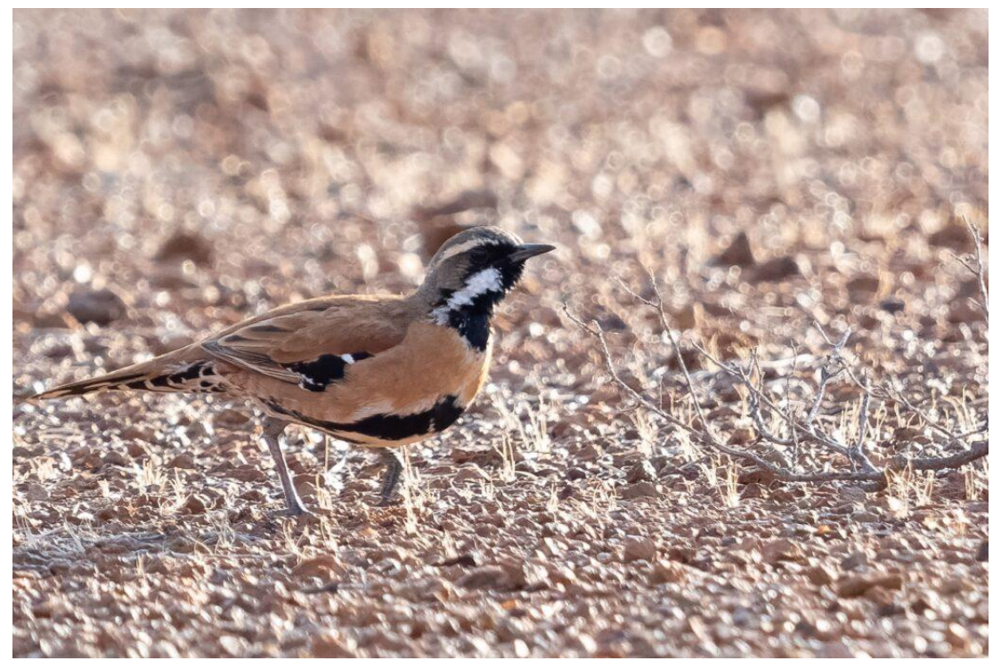
Western Quail-thrush