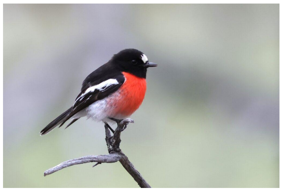
Scarlet Robin