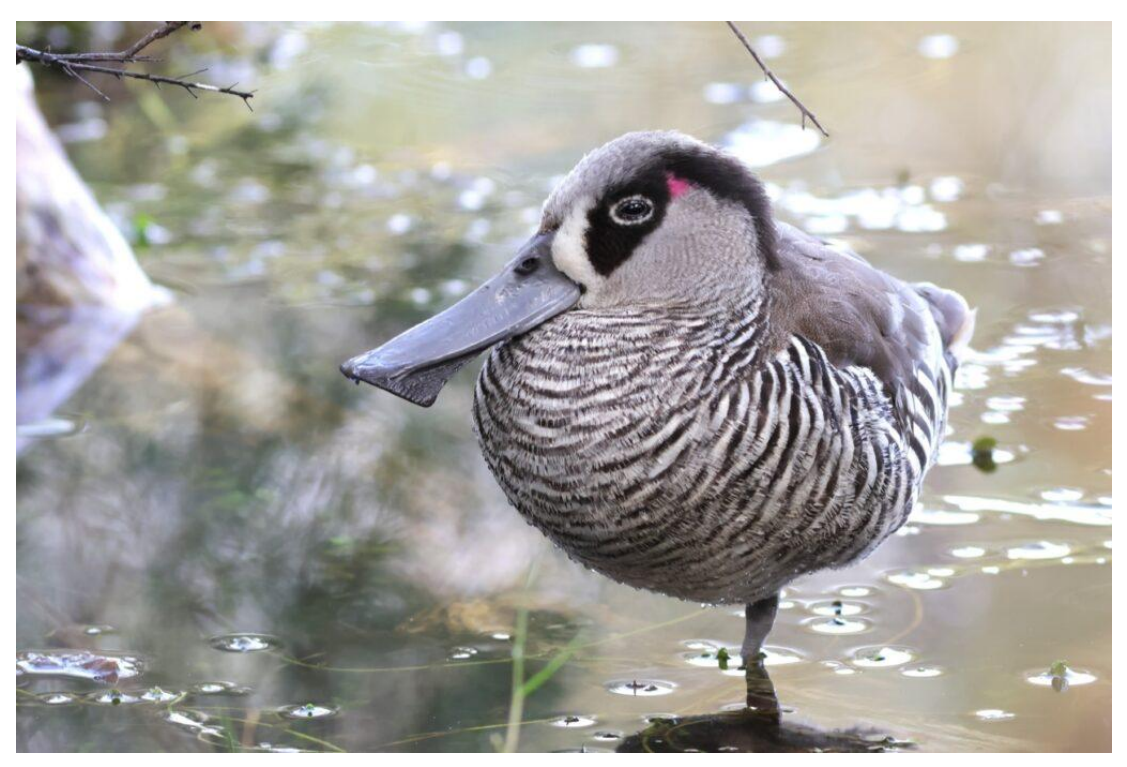
Pink-eared Duck