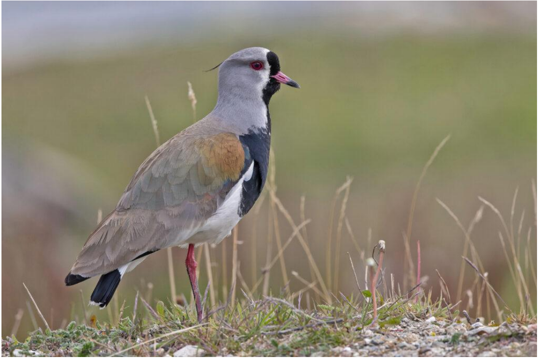
Southern Lapwing