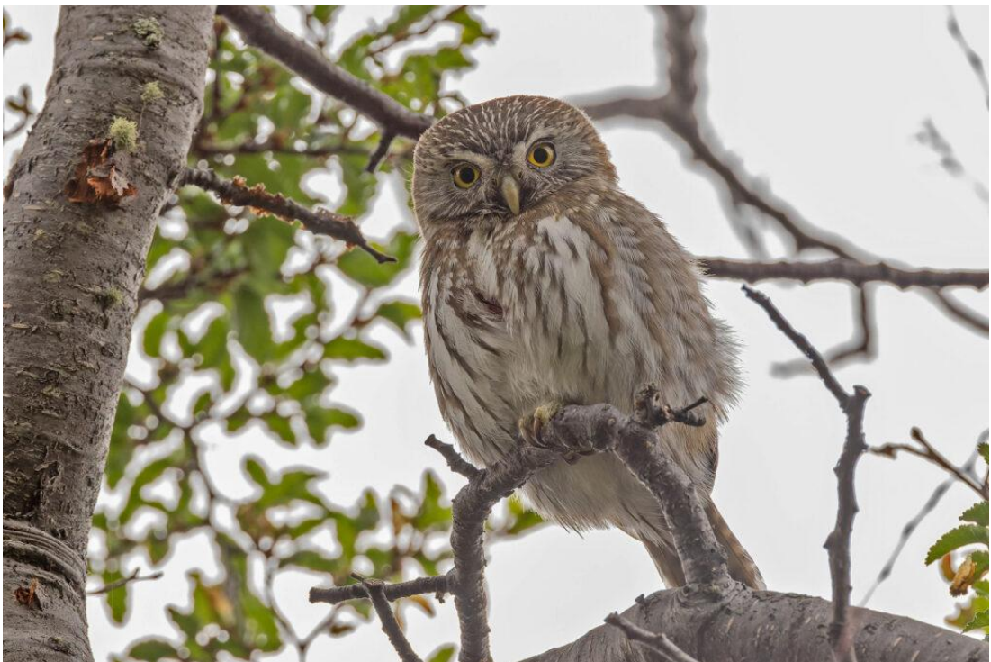
Austral Pygmy Owl