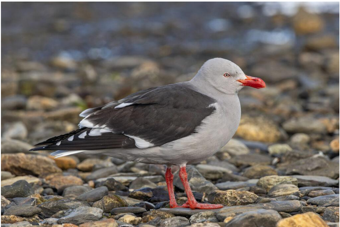
Dolphin Gull