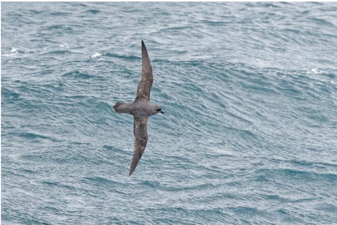
Kerguelen Petrel