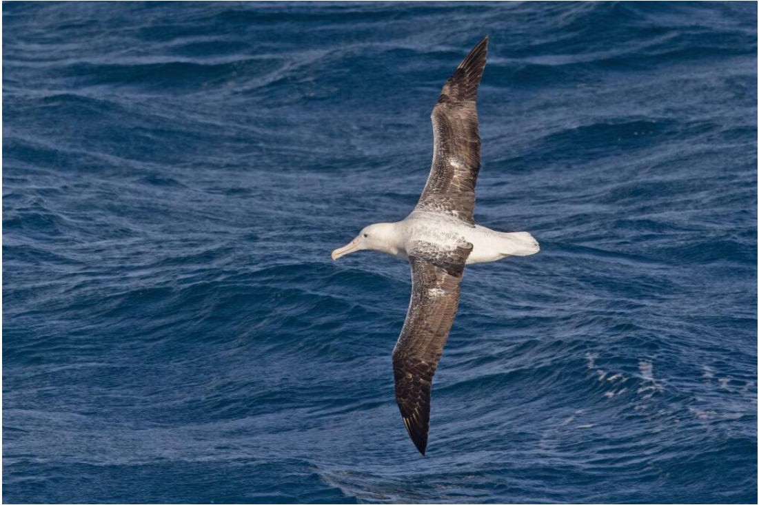
Southern Royal Albatross