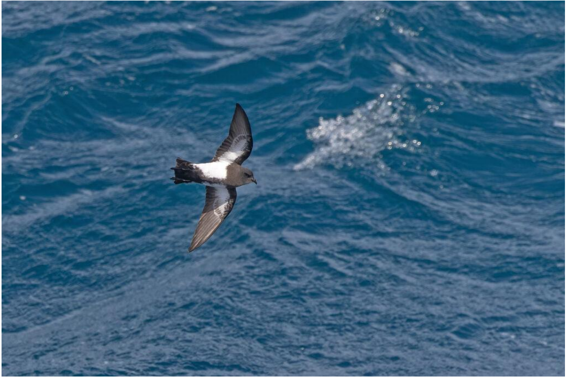
Black-bellied Storm Petrel