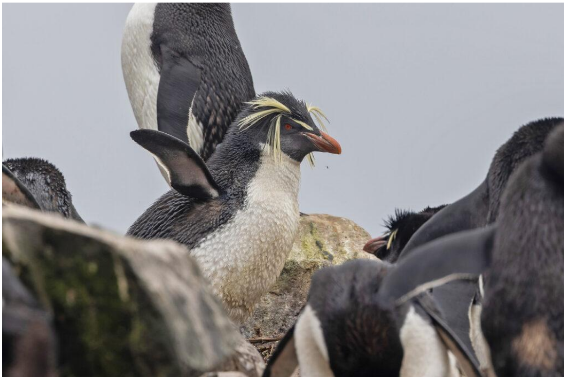
Northern Rockhopper Penguin