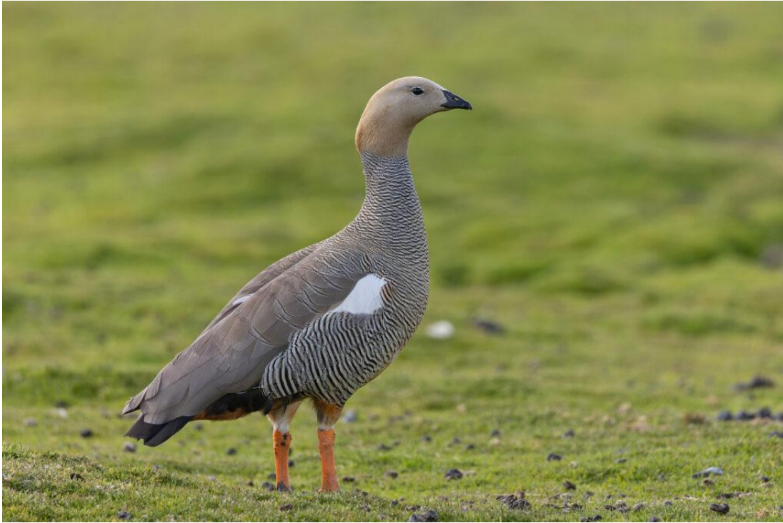
Ruddy-headed Goose