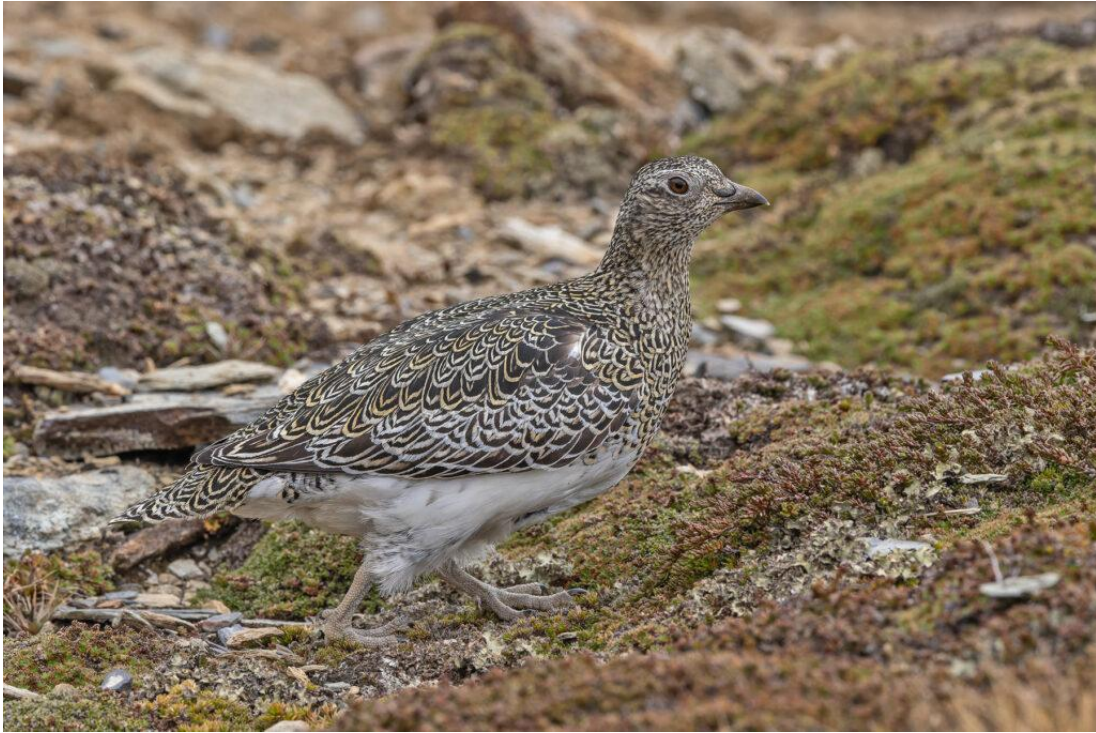
White-bellied Seedsnipe