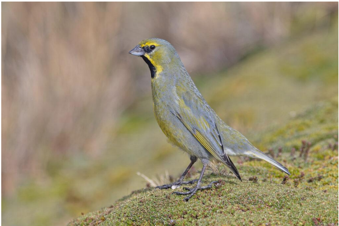
Yellow-bridled Finch