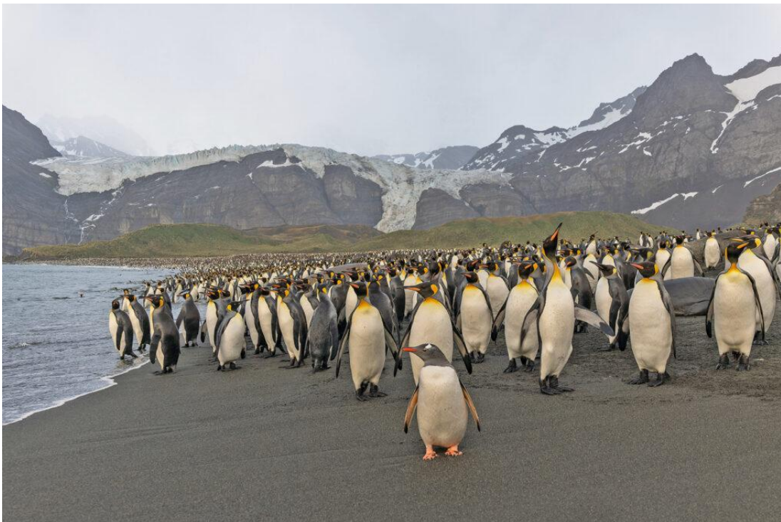
Gentoo Penguin and King Penguins