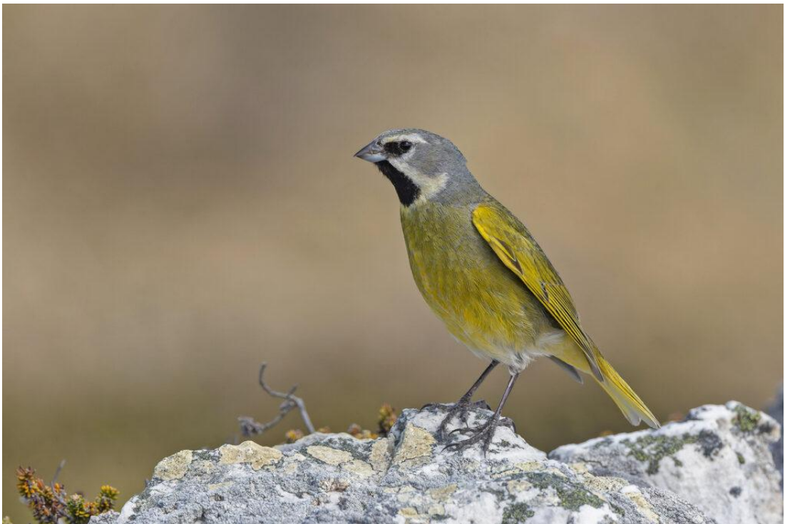
White-bridled Finch