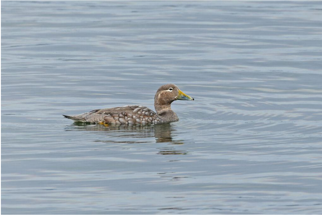
Flying Steamer Duck