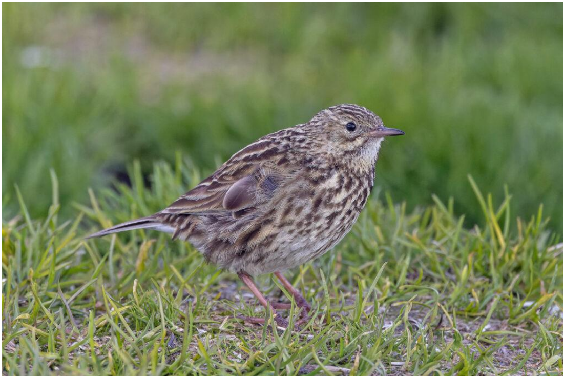
South Georgia Pipit