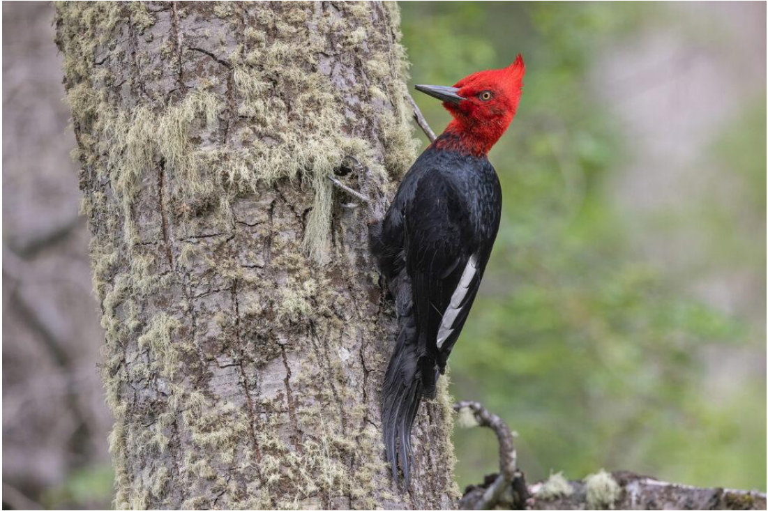
Magellanic Woodpecker