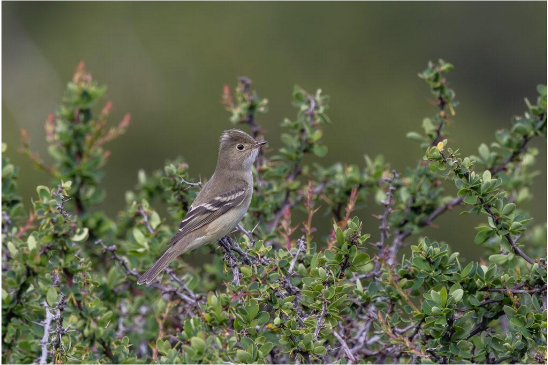
Chilean Elaenia