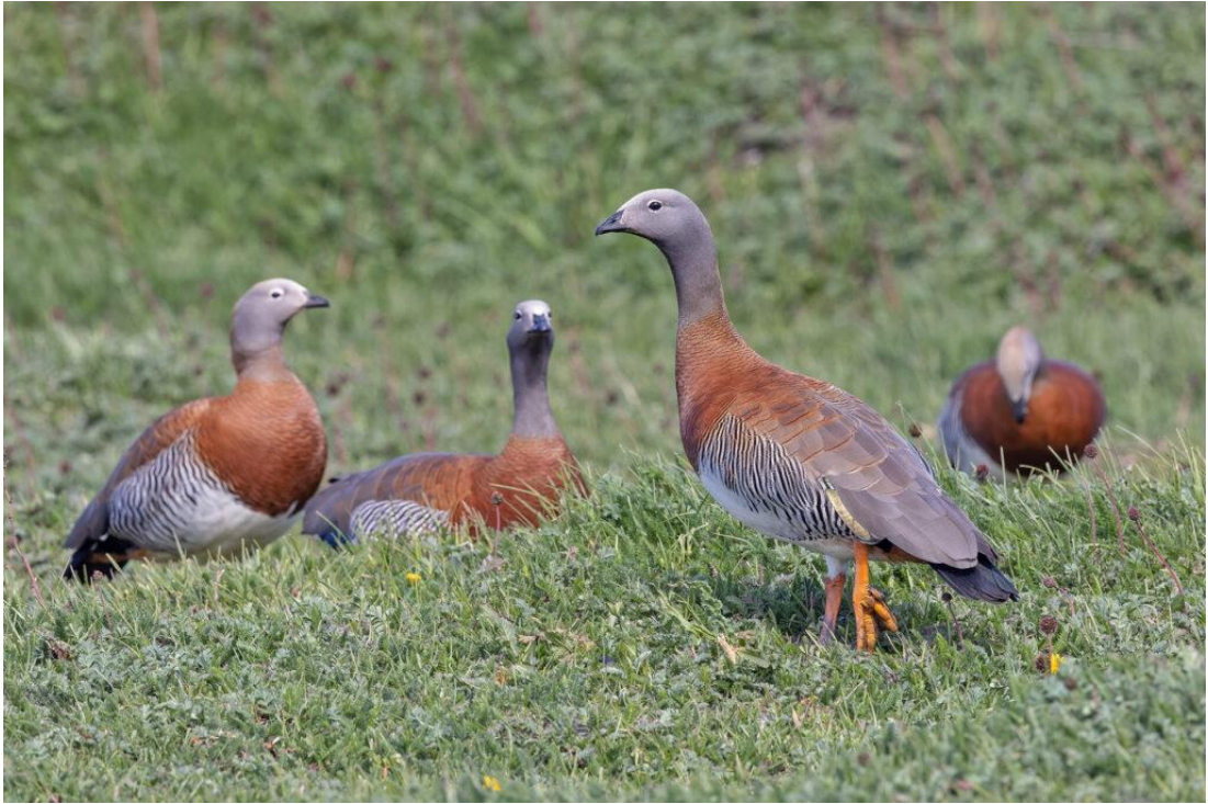
Ashy-headed Geese