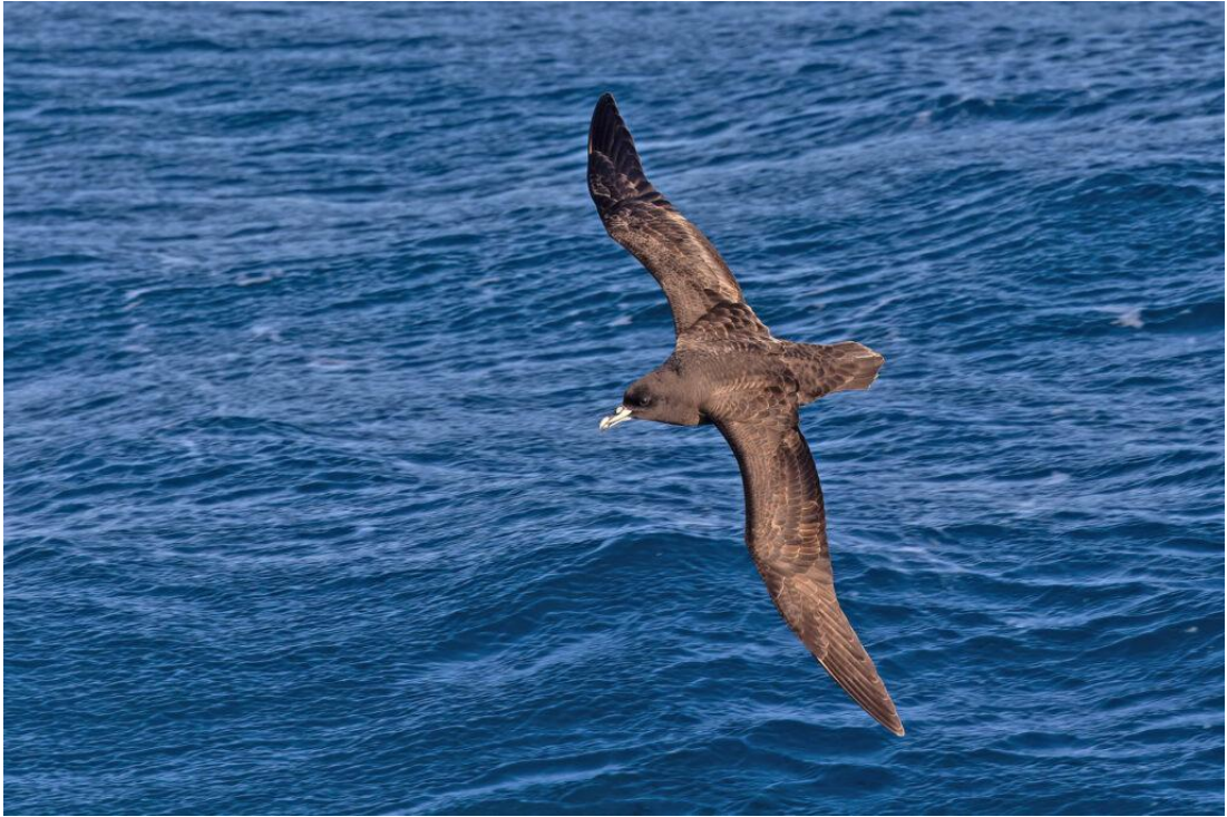
White-chinned Petrel