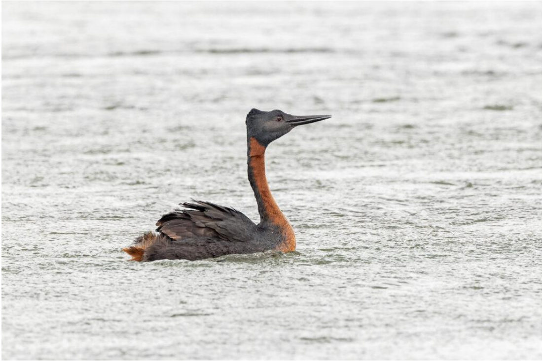
Great Grebe