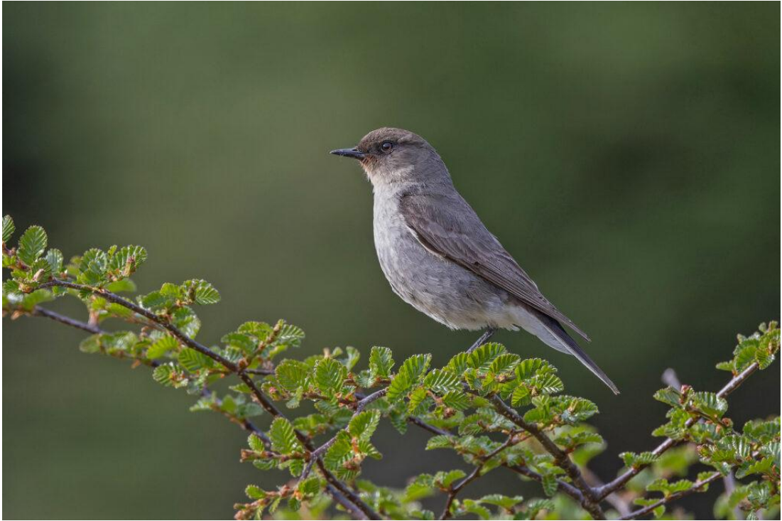
Dark-faced Ground Tyrant