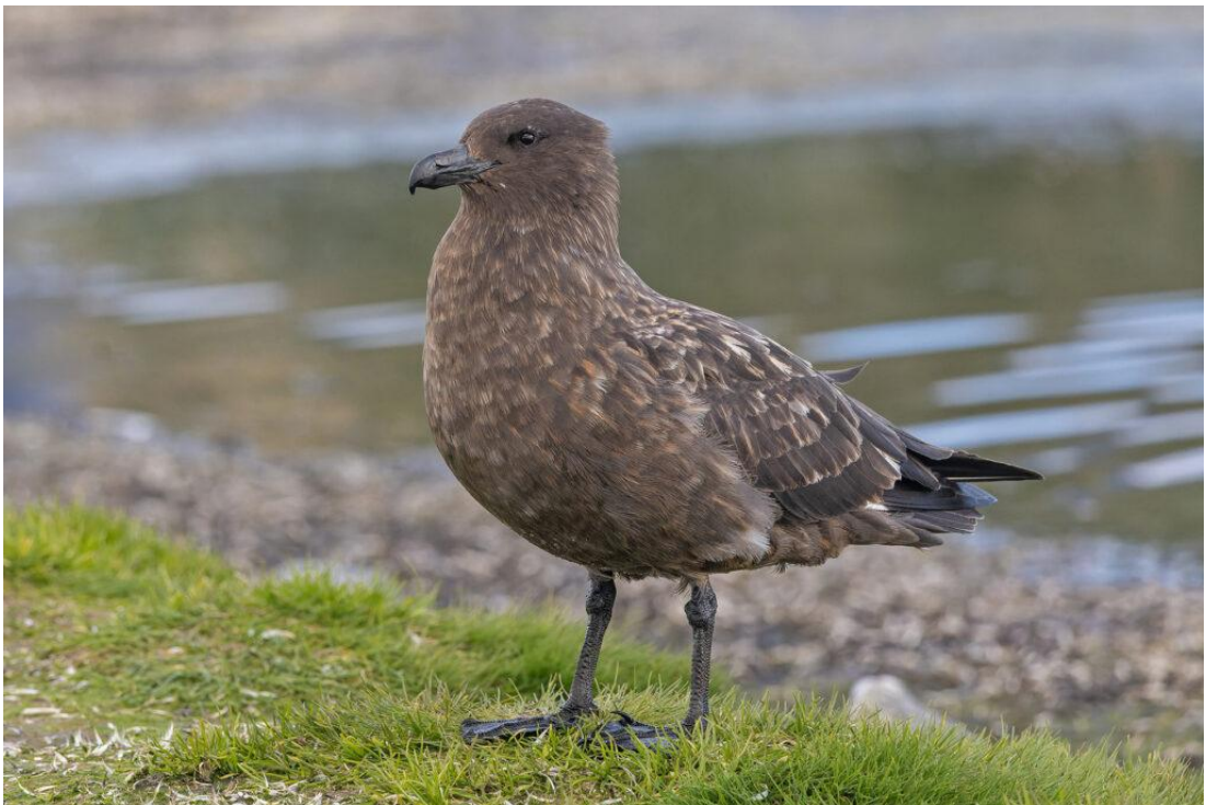
Brown Skua