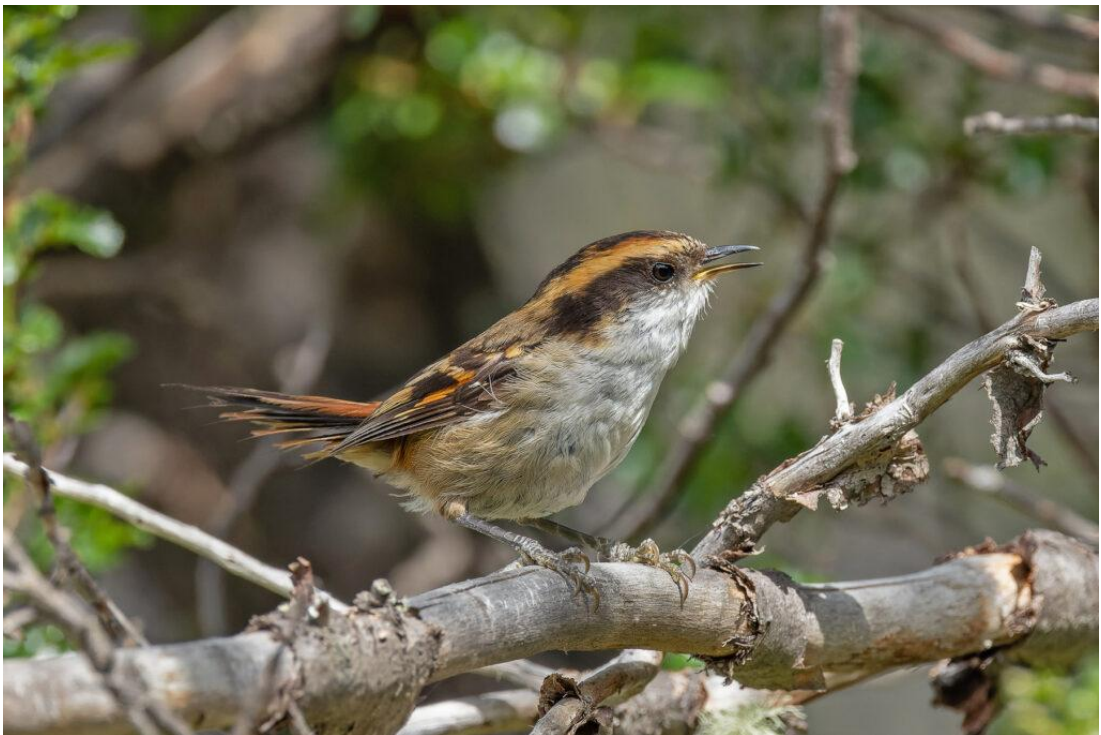
Thorn-tailed Ryadito