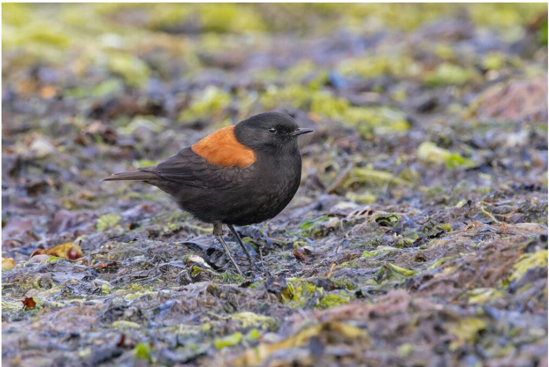
Austral Negrigo