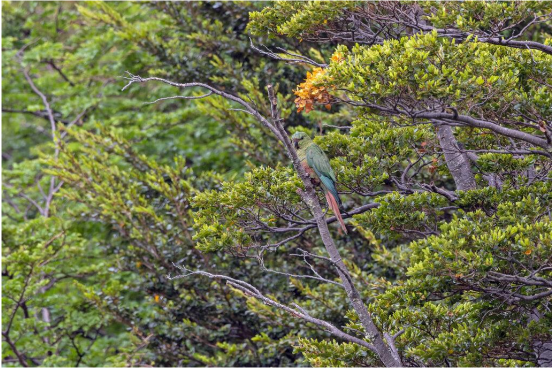
Austral Parakeet