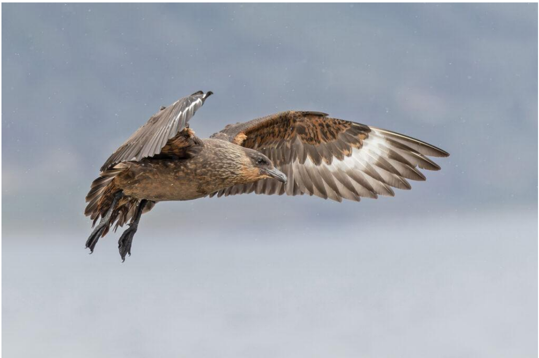
Chilean Skua