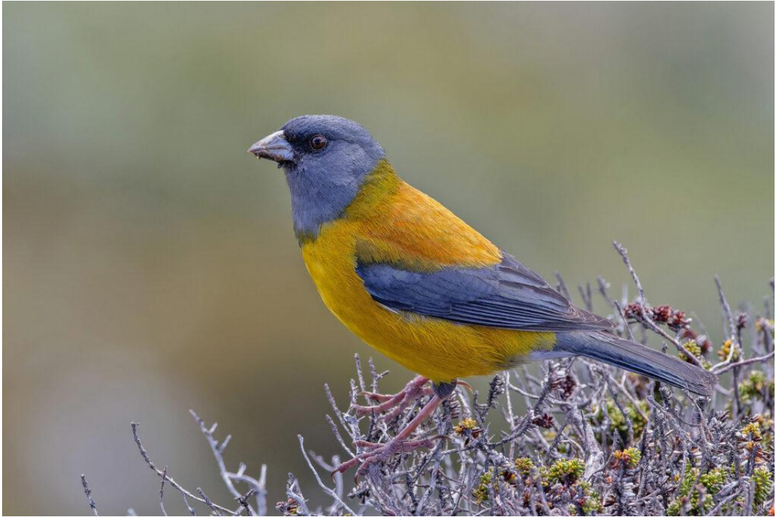
Patagonian Sierra Finch