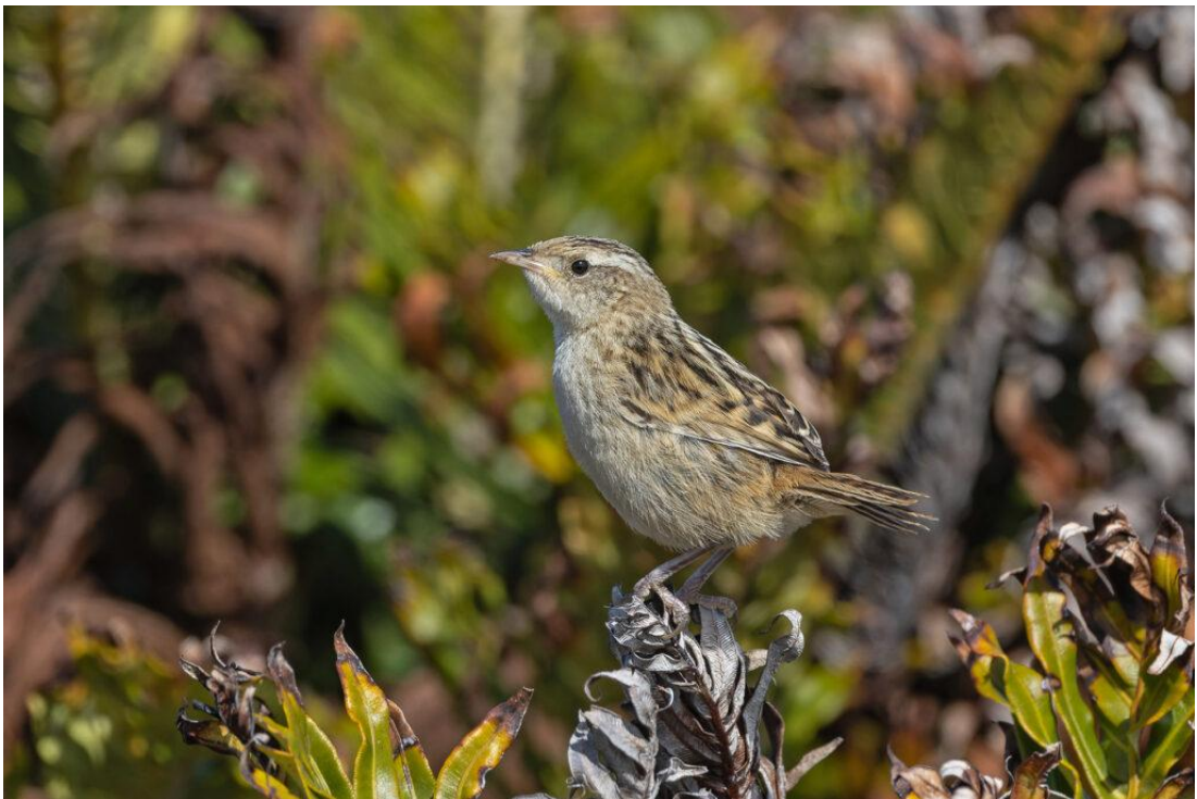
Grass Wren