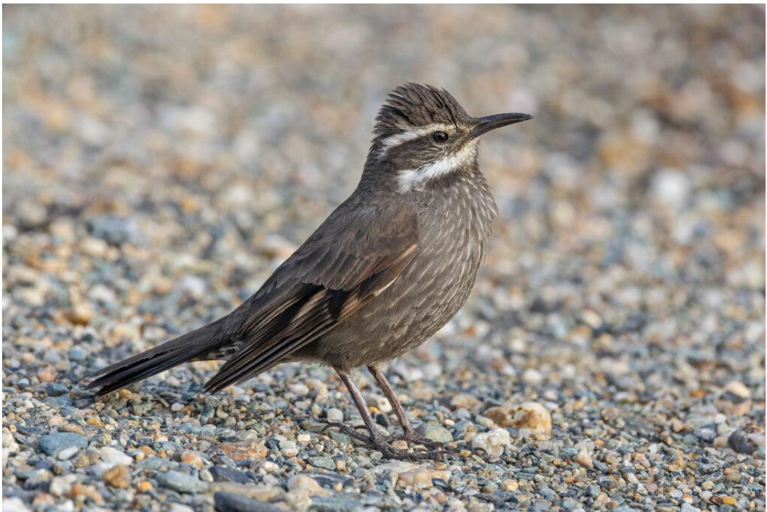
Dark-bellied Cinclodes