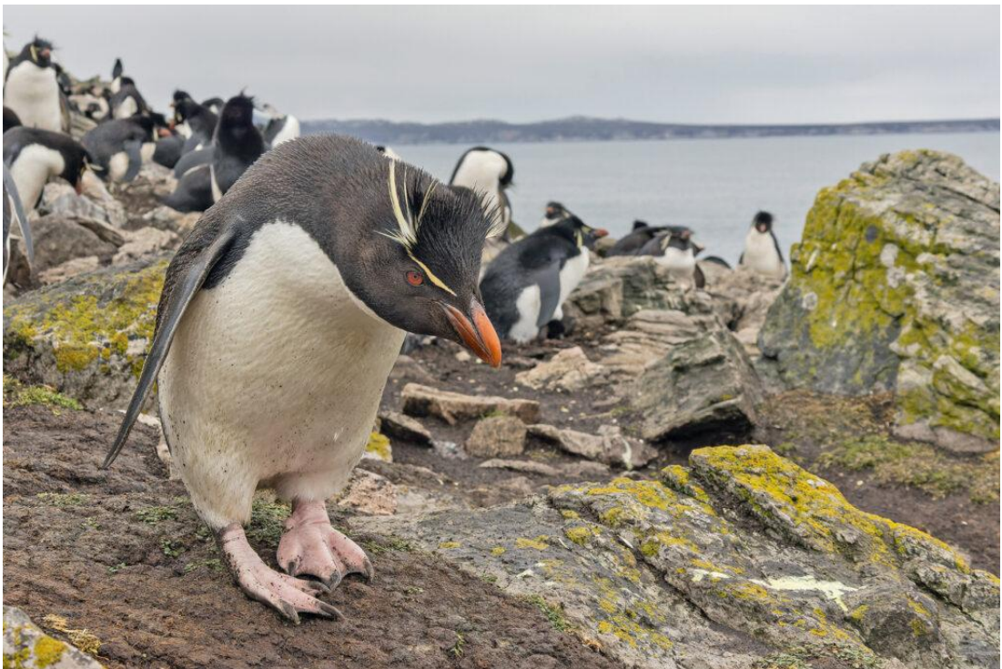
Southern Rockhopper Penguin