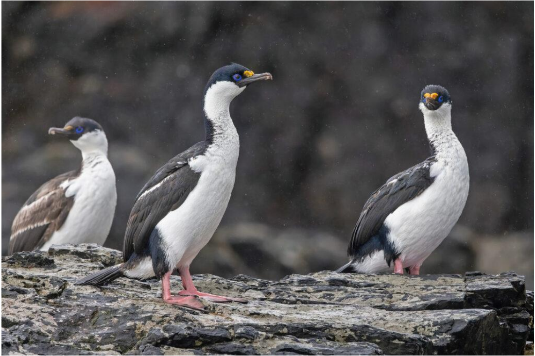
South Georgia Shag