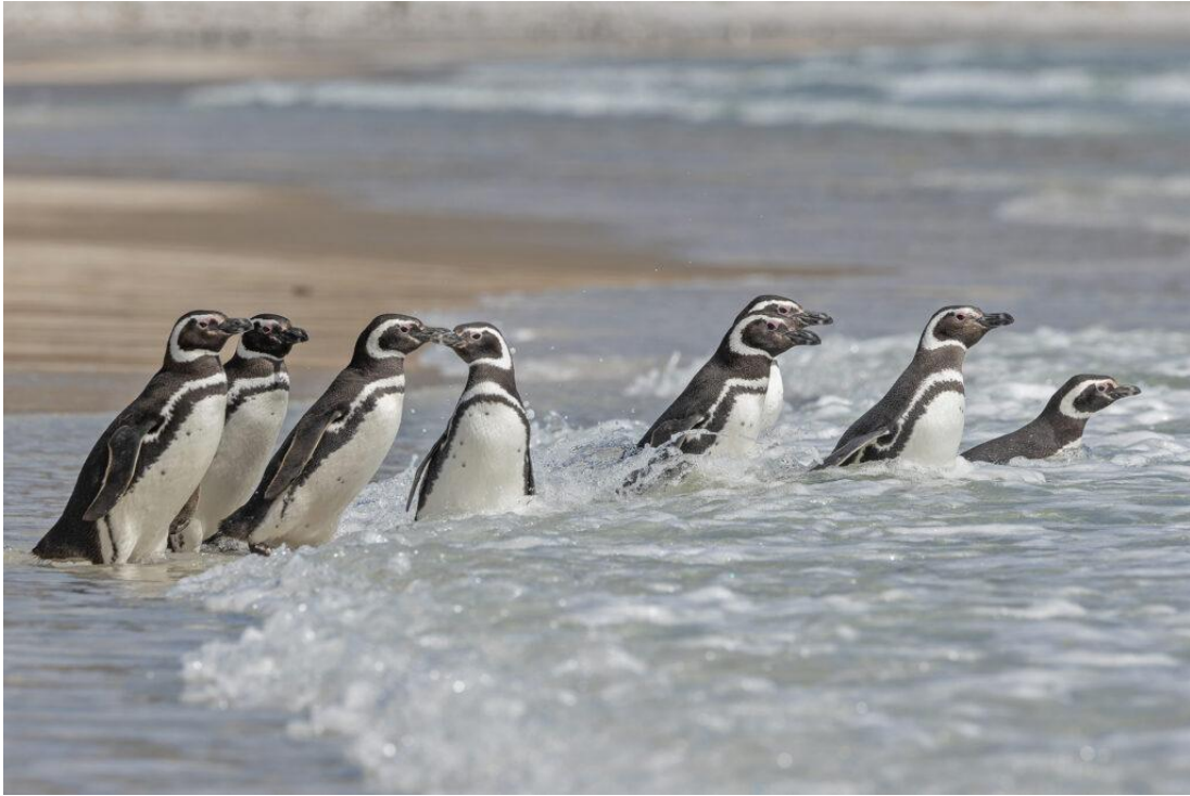
Magellanic Penguin