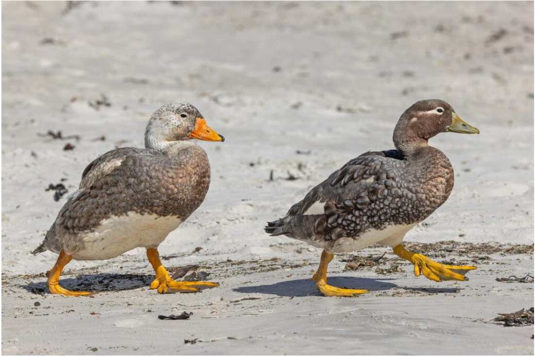
Falkland Steamer Duck