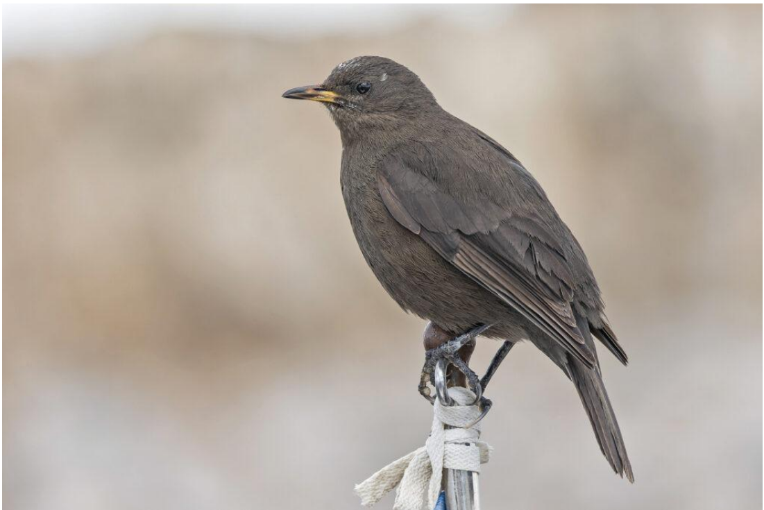
Blackish (Black) Cinclodes