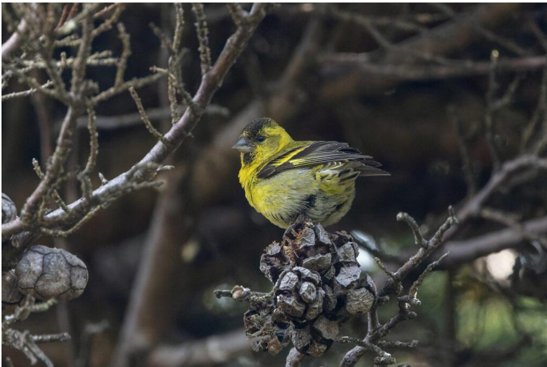
Black-chinned Siskin