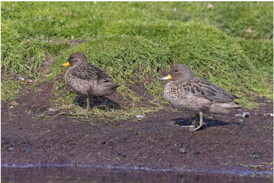
Speckled Teal