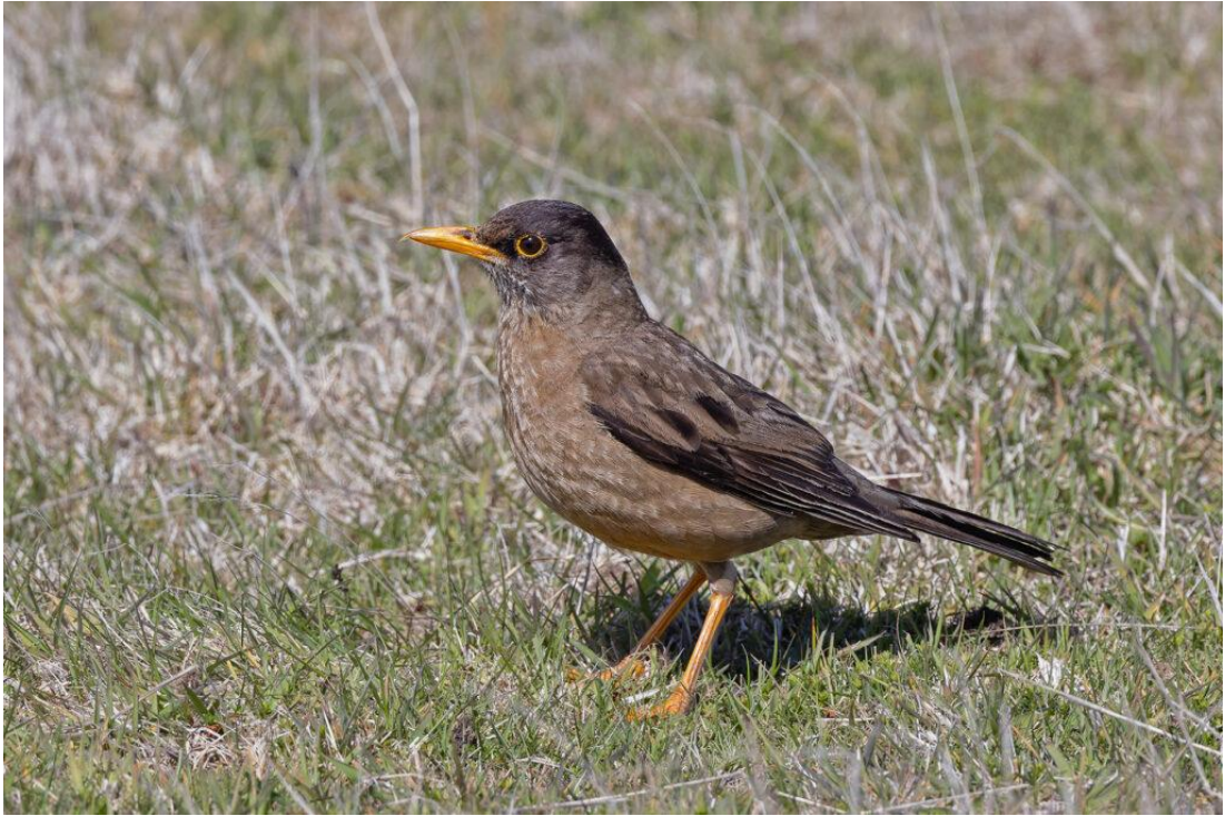
Austral Thrush