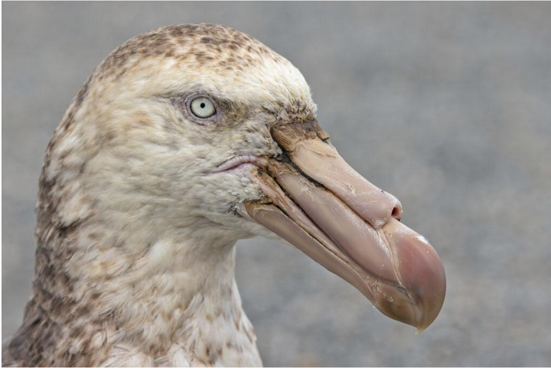
Northern Giant Petrel