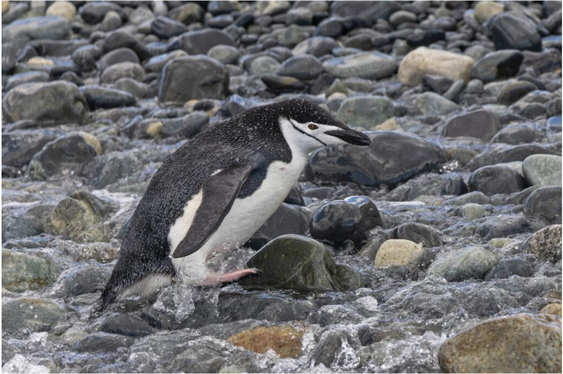
Chinstrap Penguin