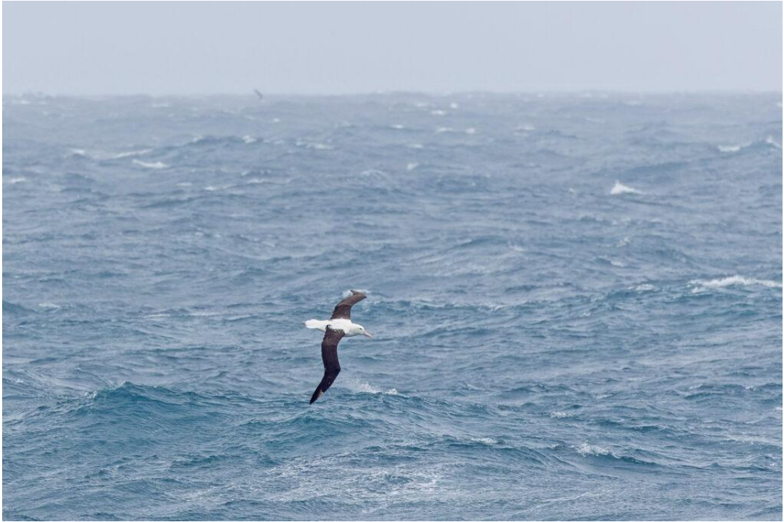
Northern Royal Albatross