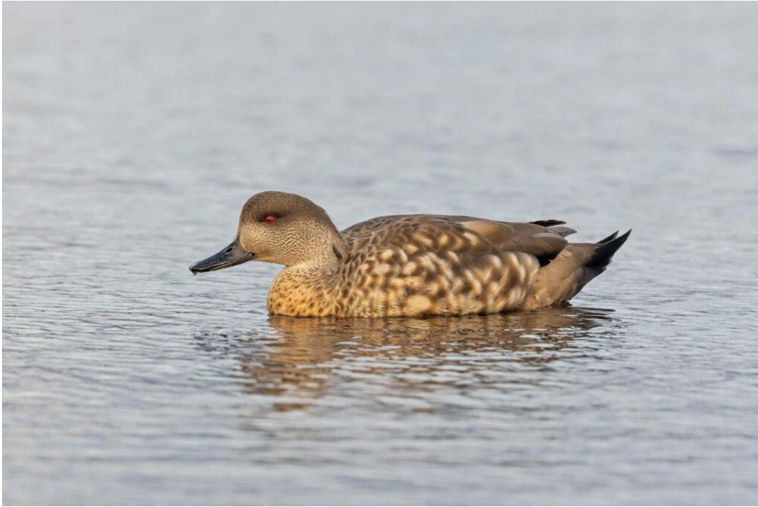
Crested Duck