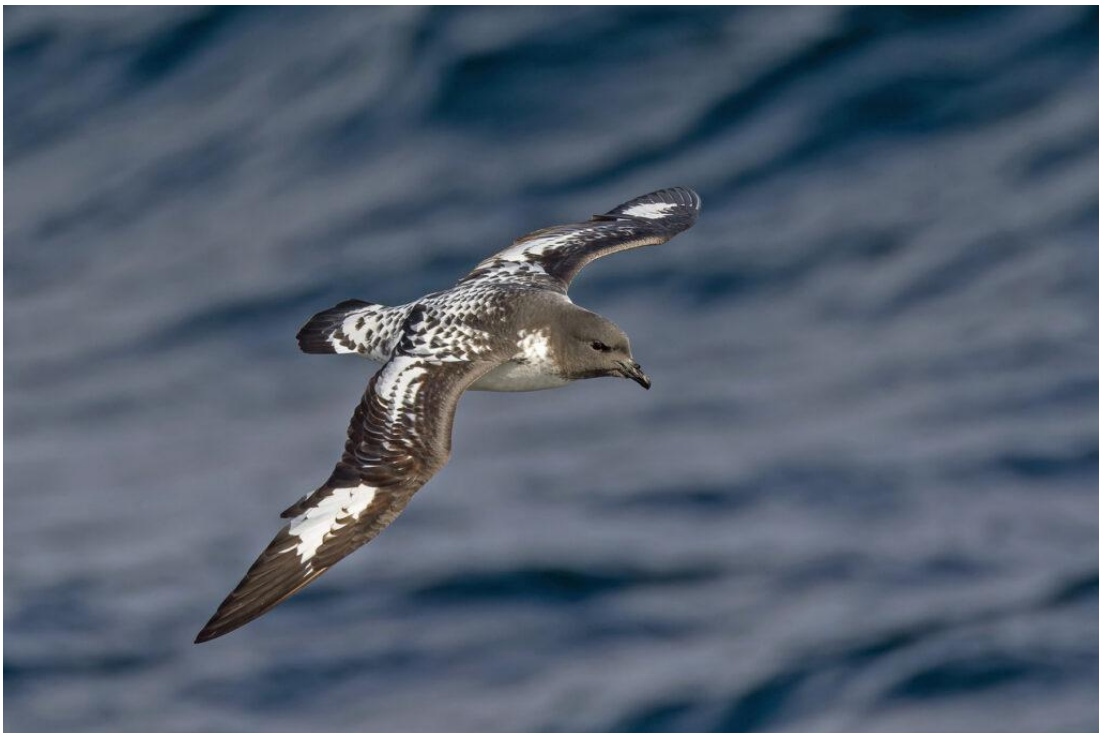
Cape Petrel