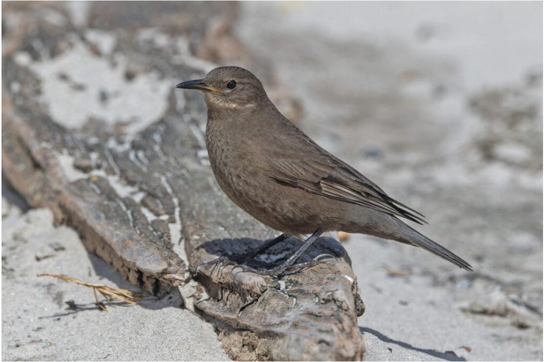
Blackish Cinclodes