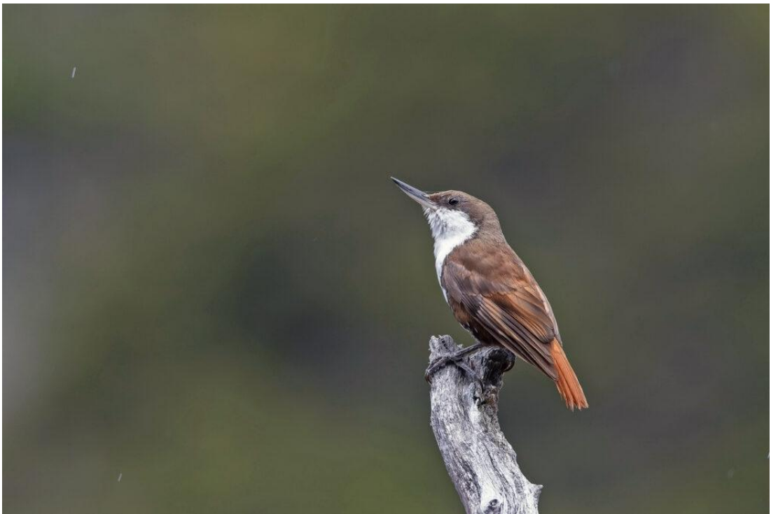
White-throated Treerunner