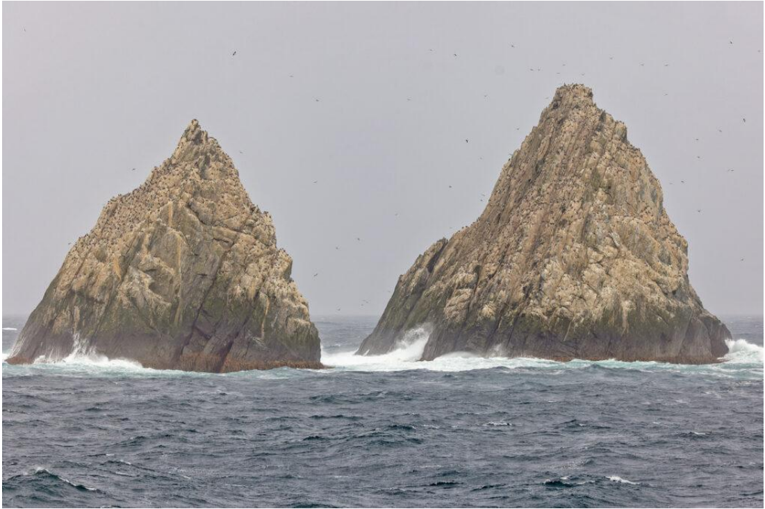
Shag Rocks