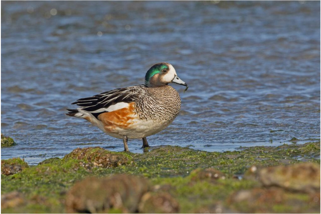
Chiloe Wigeon