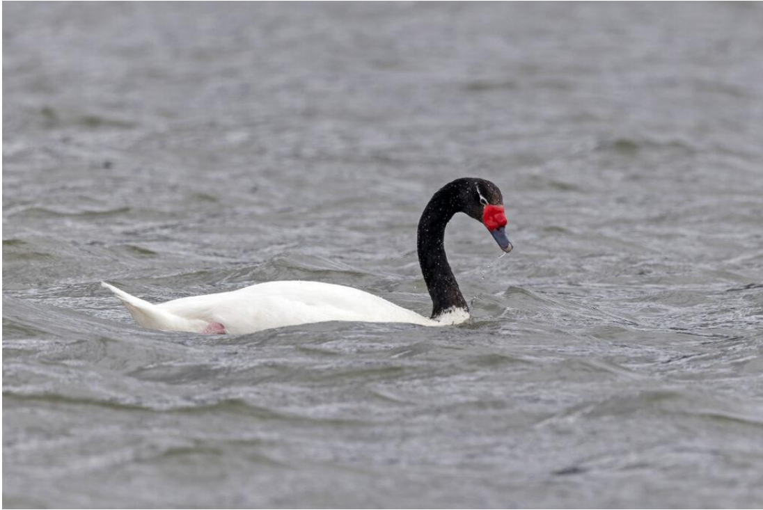
Black-necked Swan