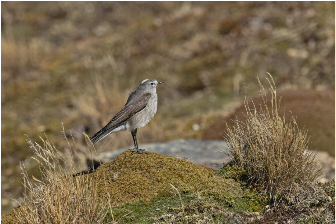
Ochre-naped Ground Tyrant