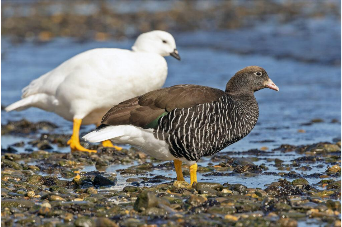
Kelp Geese