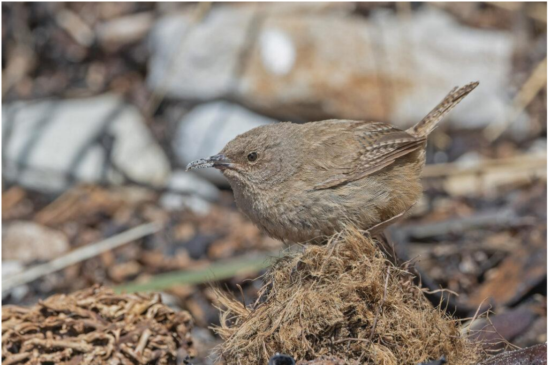
Cobb's Wren