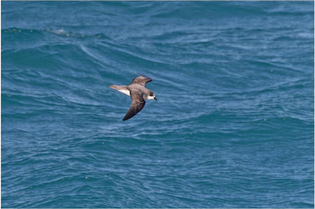
Soft-plumaged Petrel