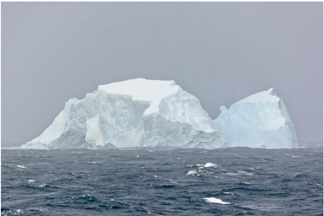
Iceberg ahead!