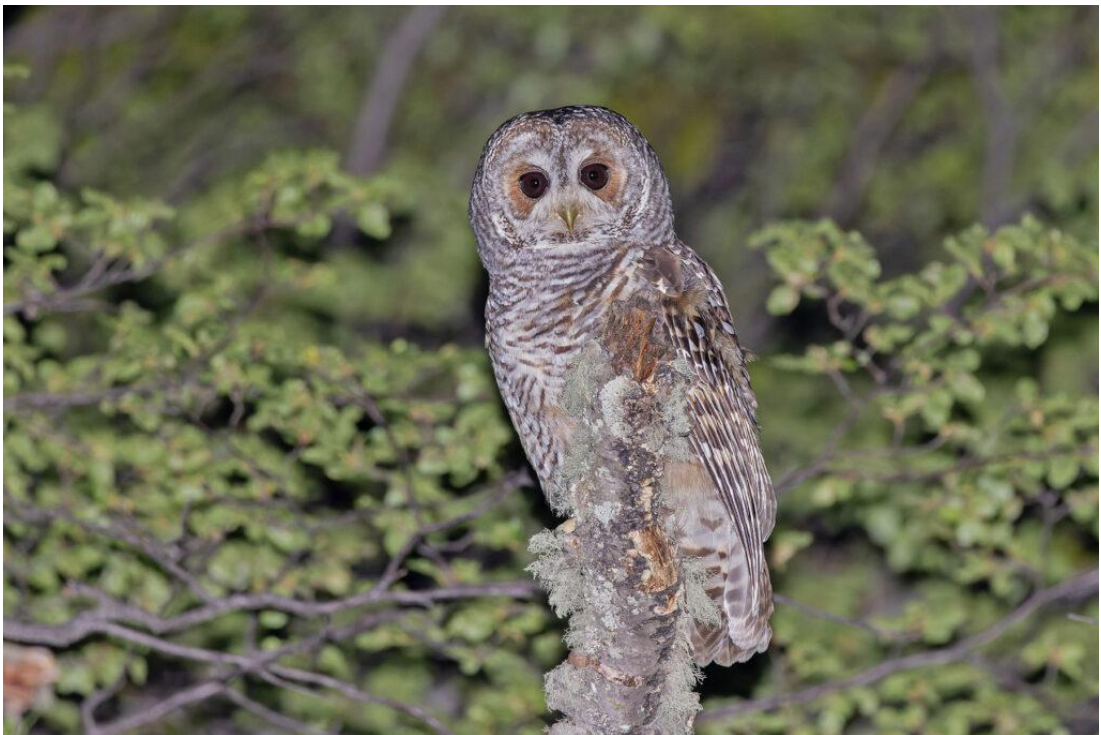
Rufous-legged Owl