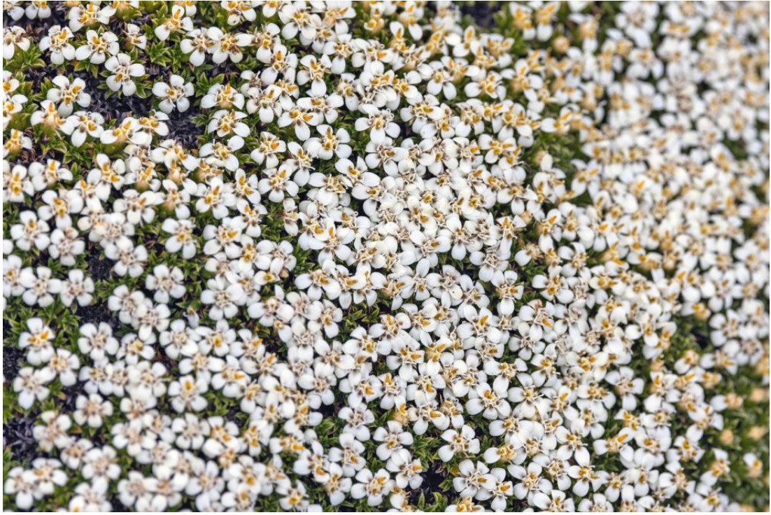
New Island flora