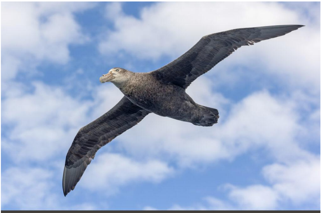
Southern Giant Petrel