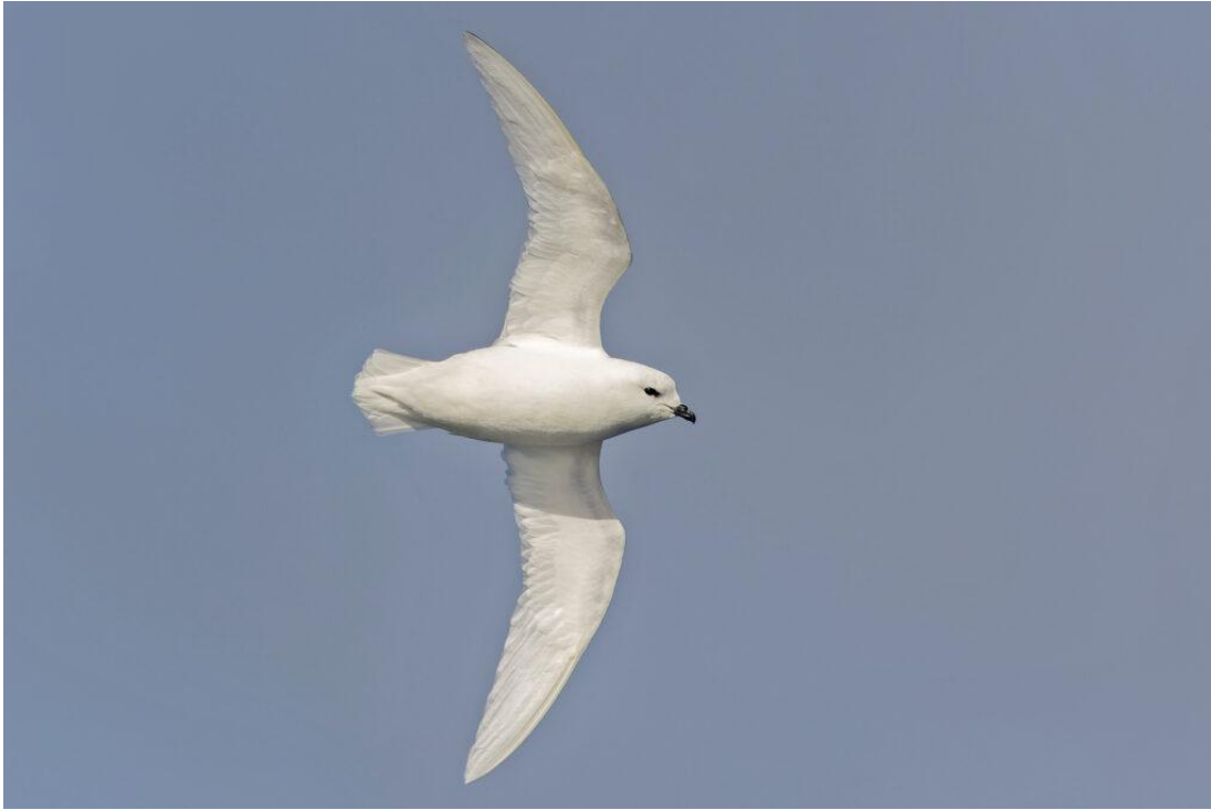
Snow Petrel