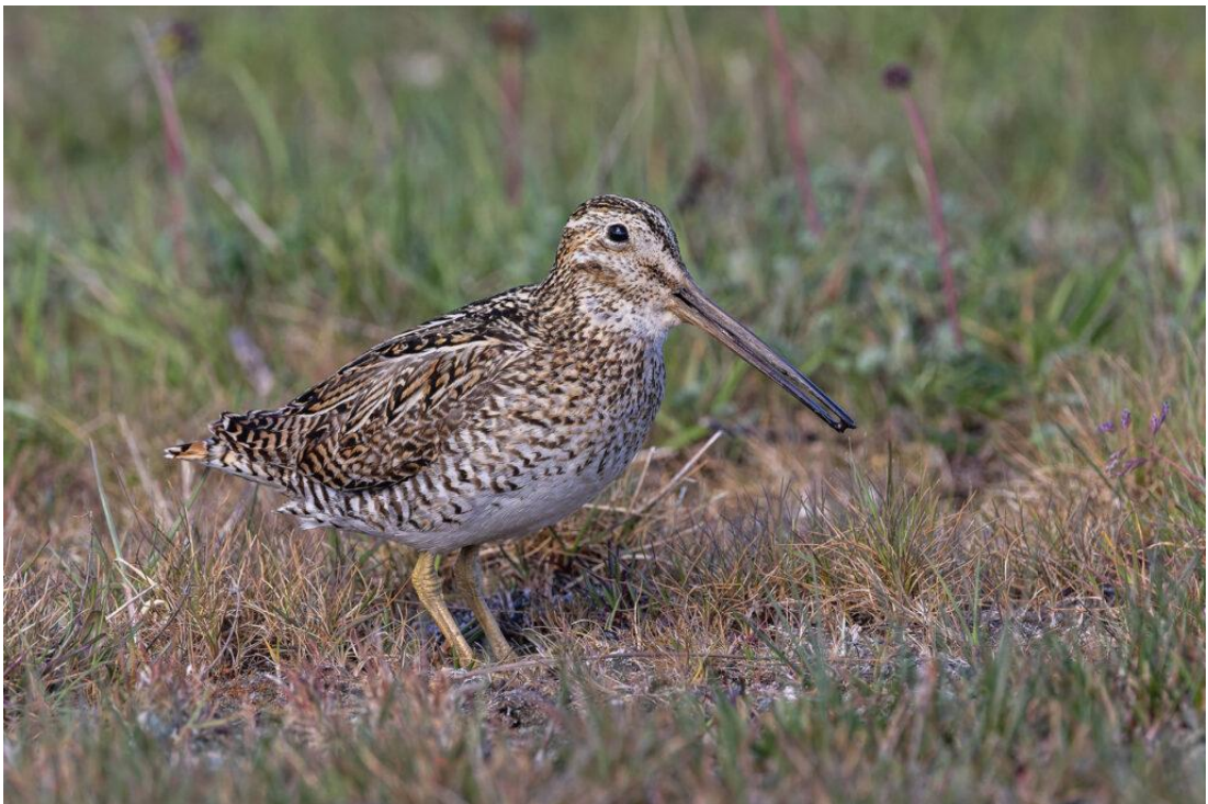
Magellanic Snipe