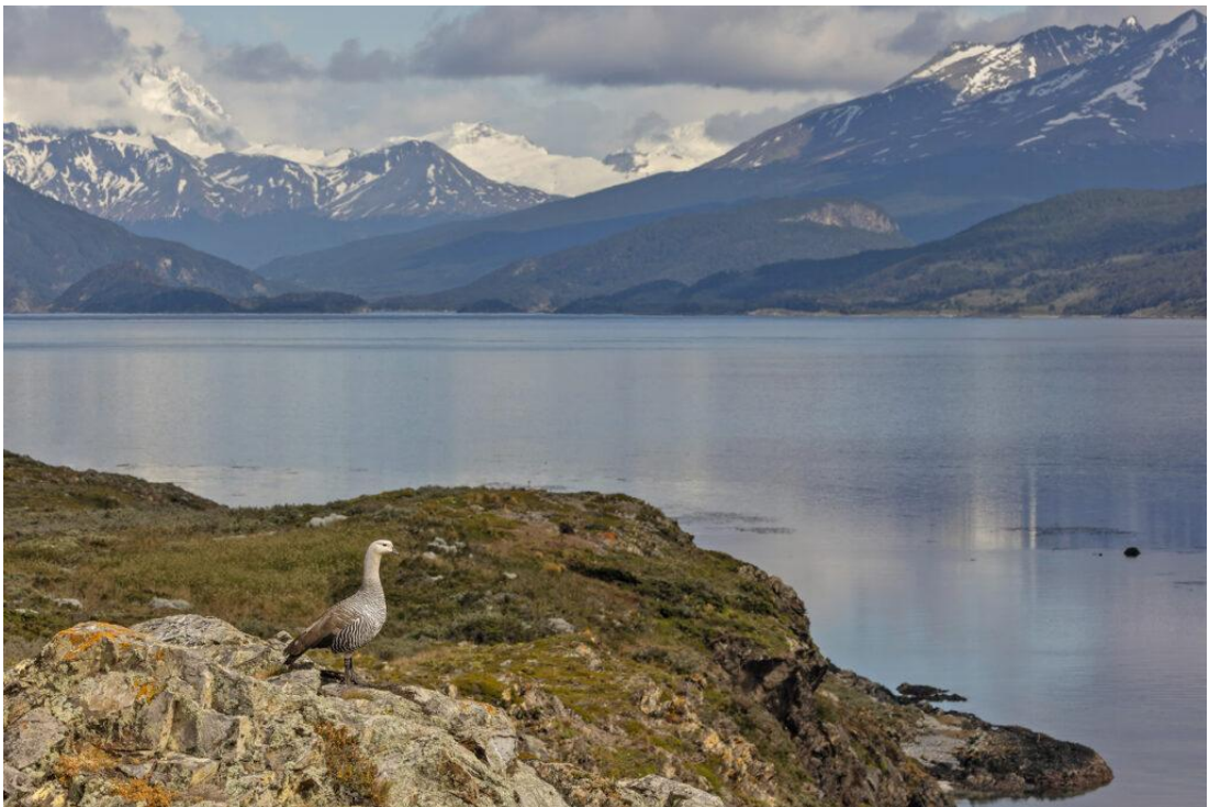
Upland Goose