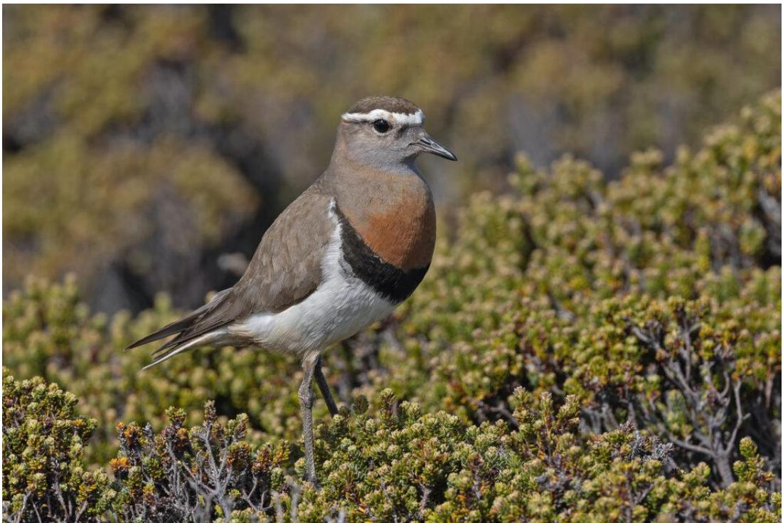
Rufous-chested Plover