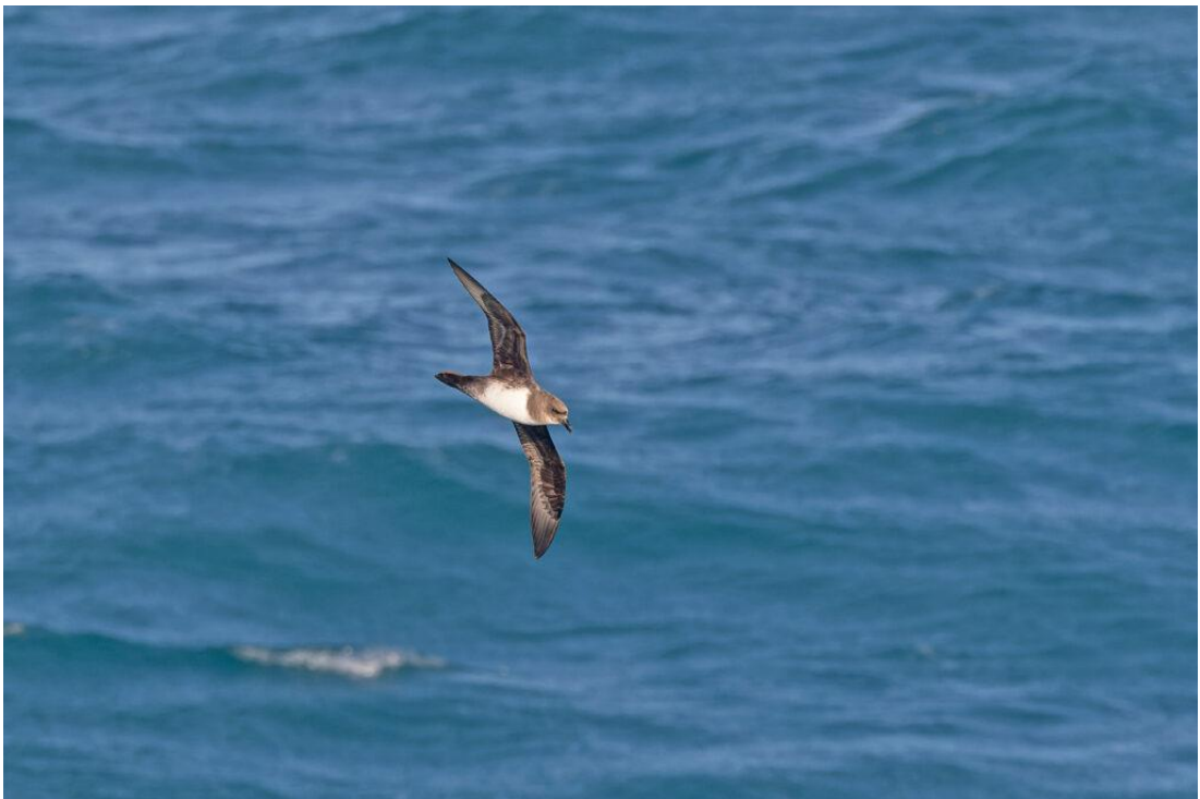
Atlantic Petrel