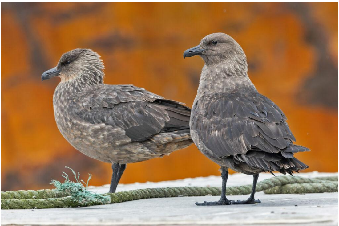
South Polar Skua