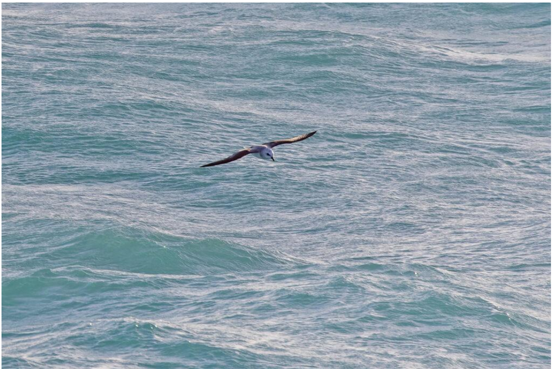
White-headed Petrel