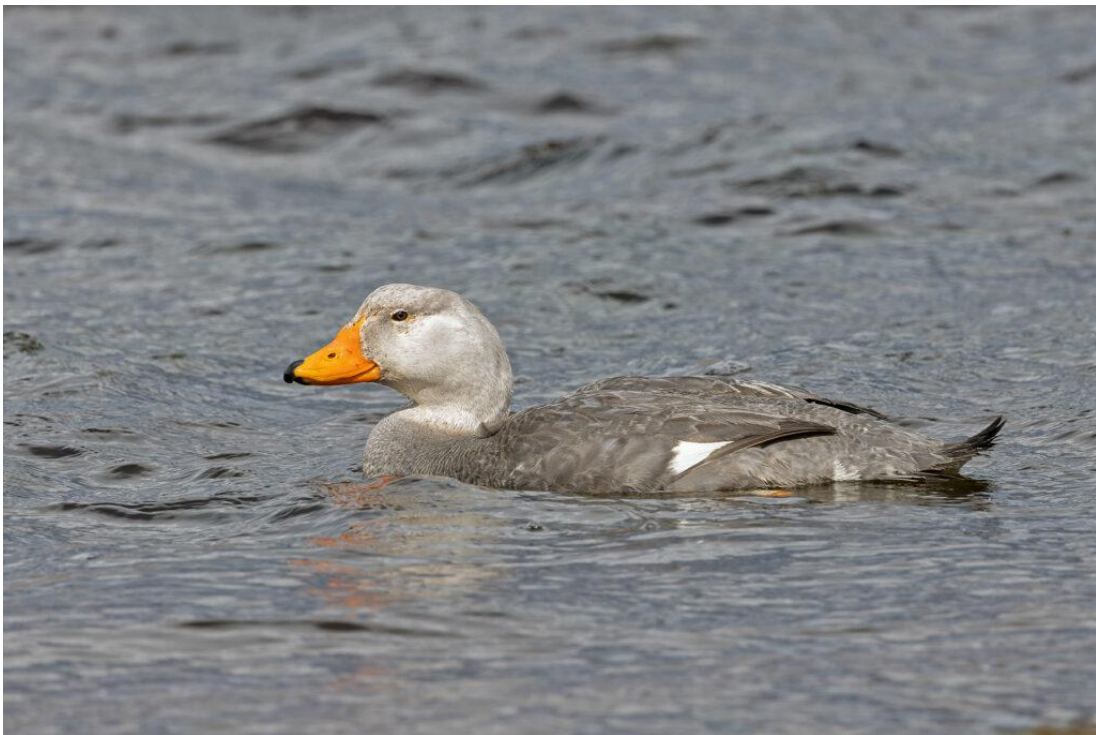
Flightless Steamer Duck