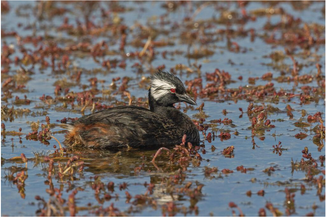
White-tufted Grebe