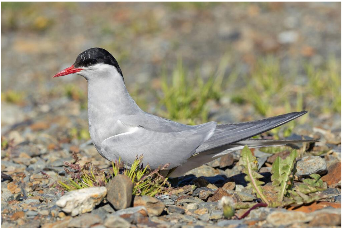
Antarctic Tern