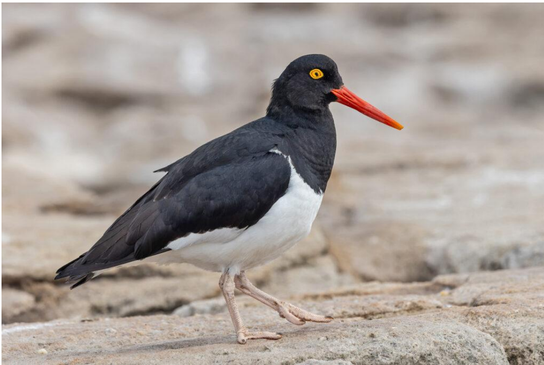
Magellanic Oystercatcher