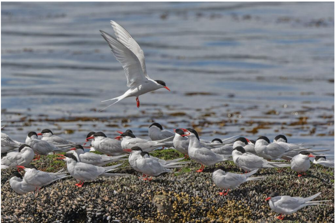
South American Tern