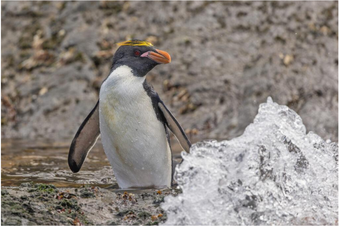
Macaroni Penguin