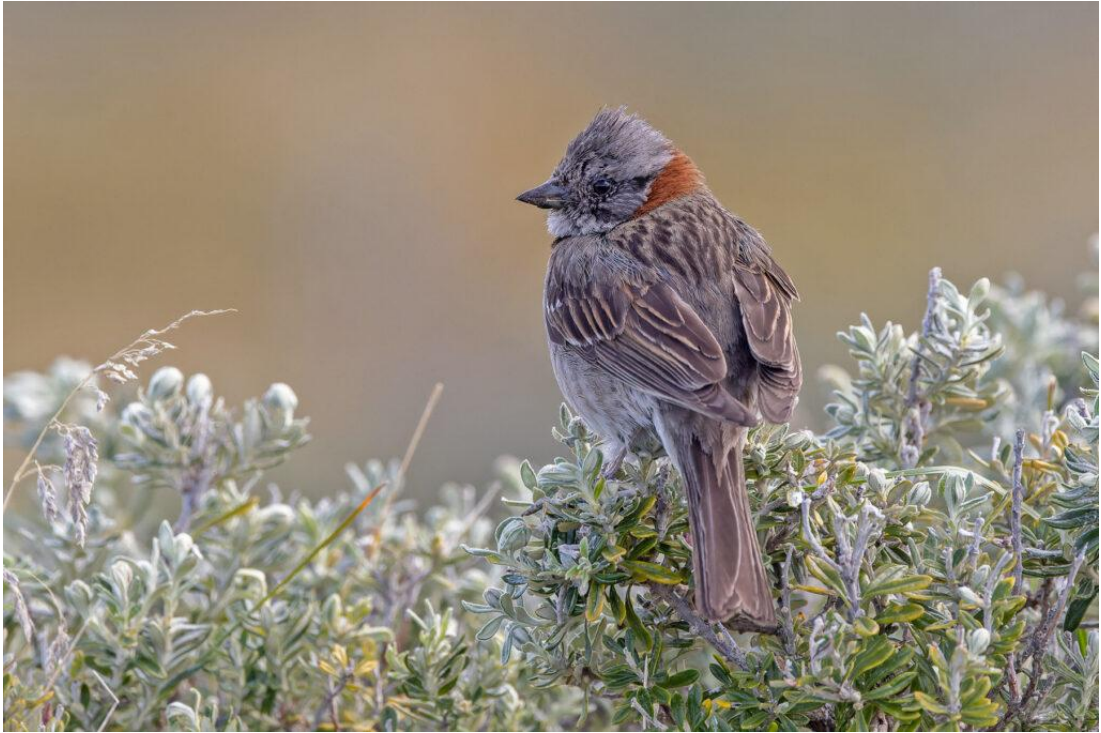
Rufous-collared Sparrow