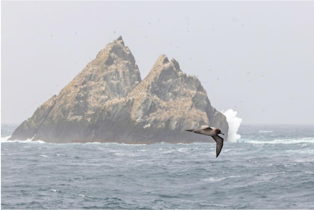
Light-mantled Albatross