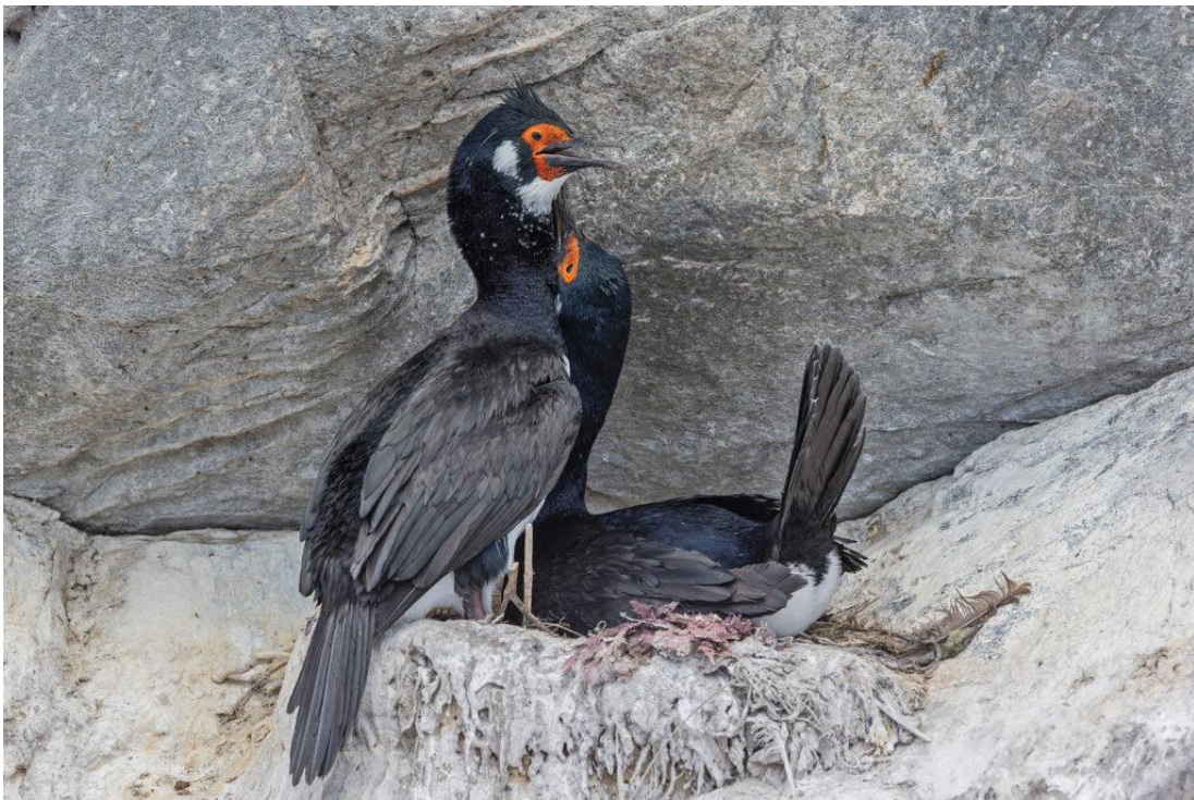
Rock Shag