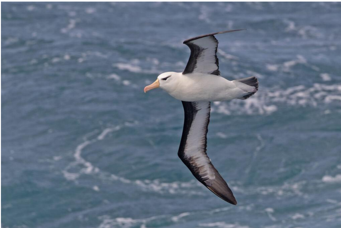
Black-browed Albatross