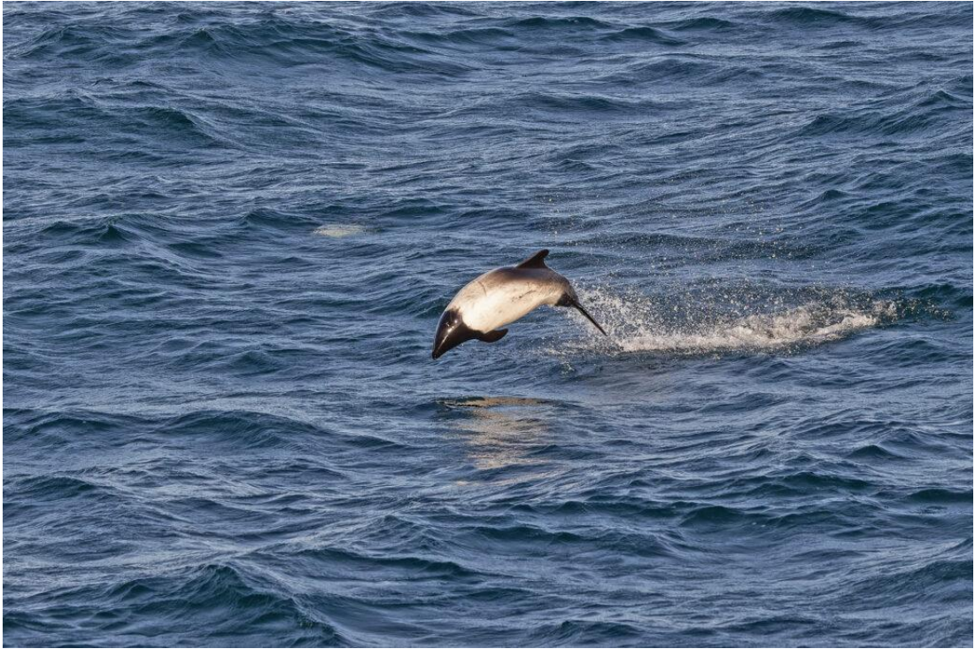
Commerson's Dolphin