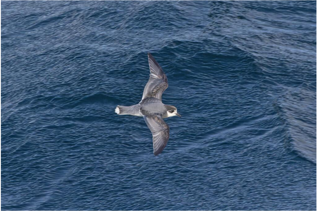
Blue Petrel