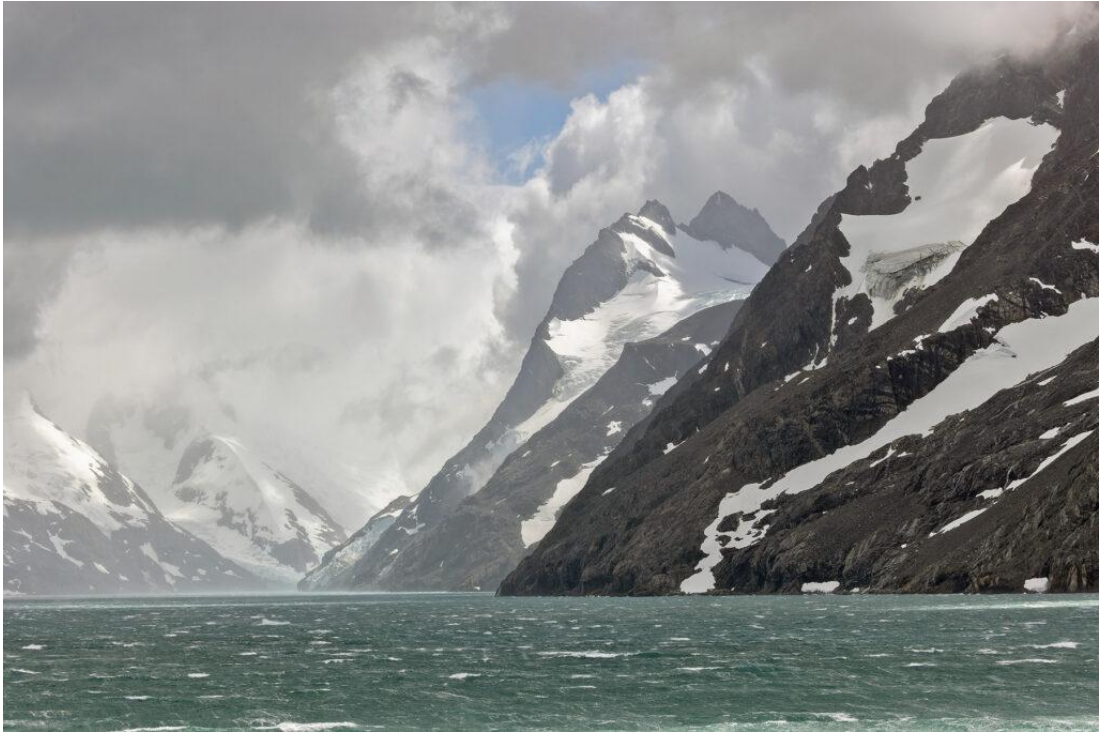
Drygalski Fjord