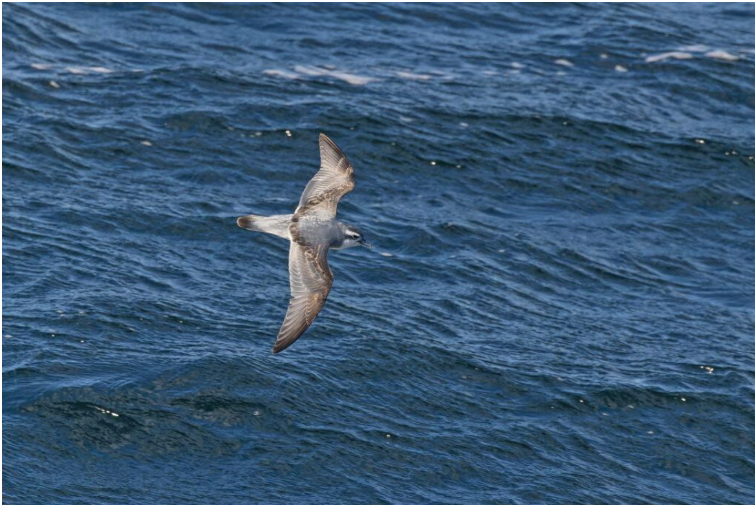
Slender-billed Prion