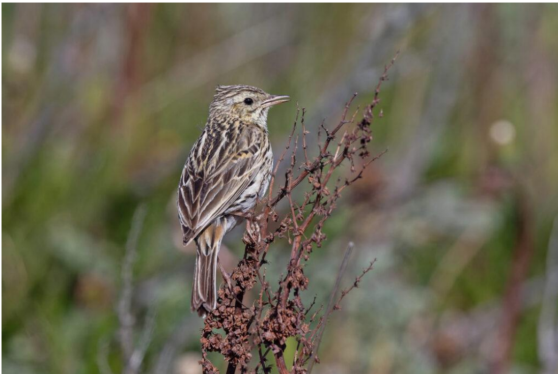
Corondera Pipit (image by Pete Morris)