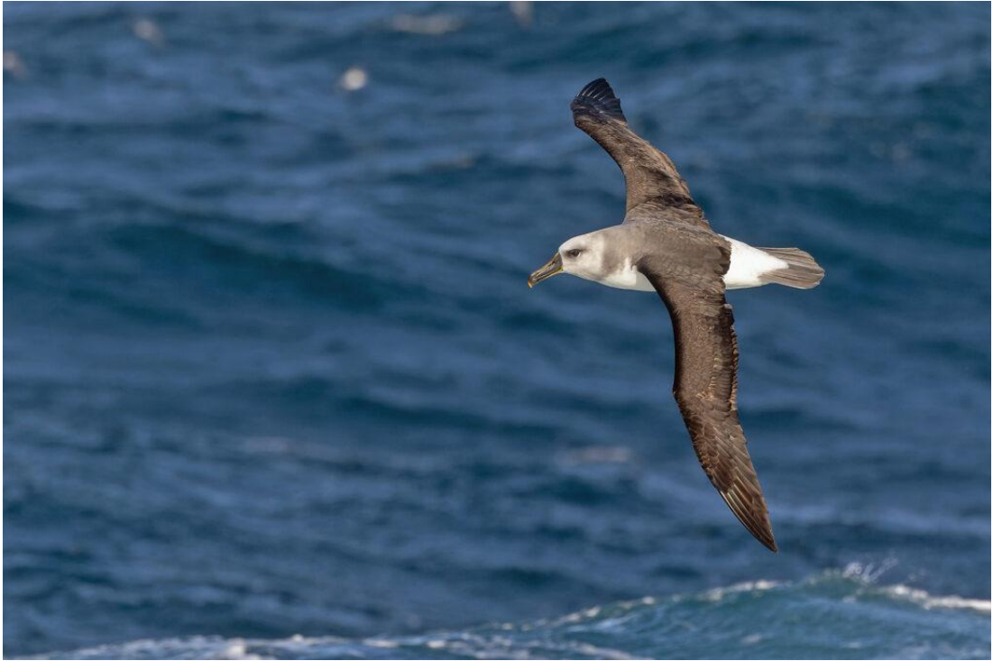
Grey-headed Albatross