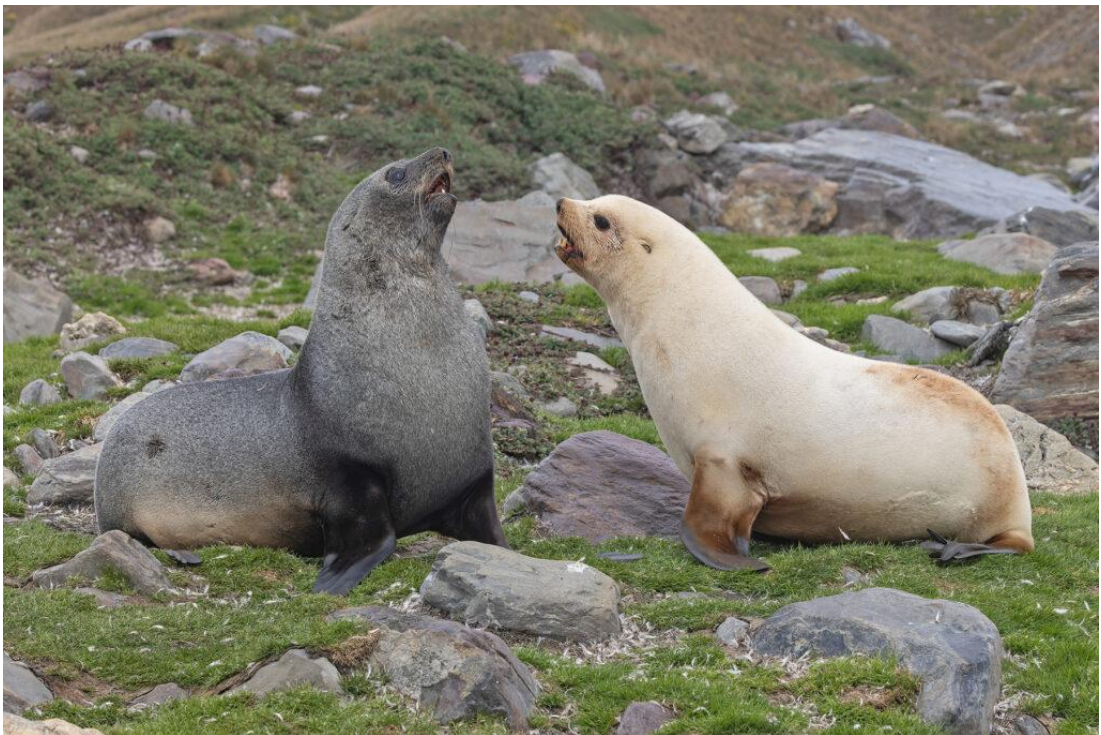
Antarctic Fur Seals