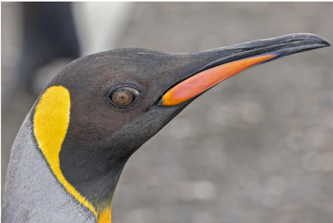
King Penguin