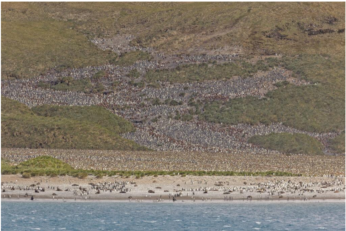
Bay of Isles