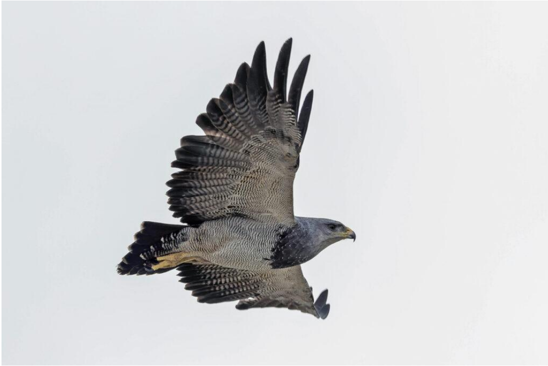
Black-chested Buzzard-Eagle