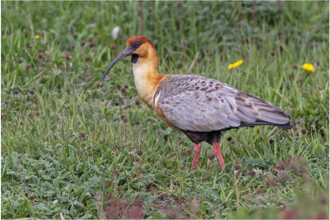
Buff-necked Ibis