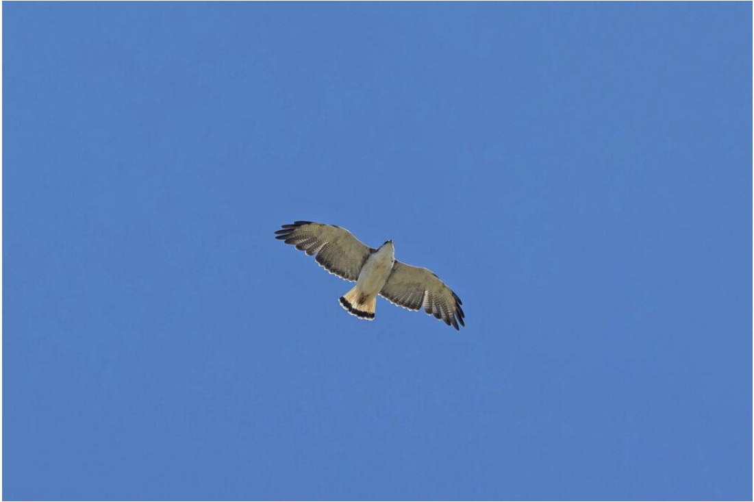
Variable Hawk