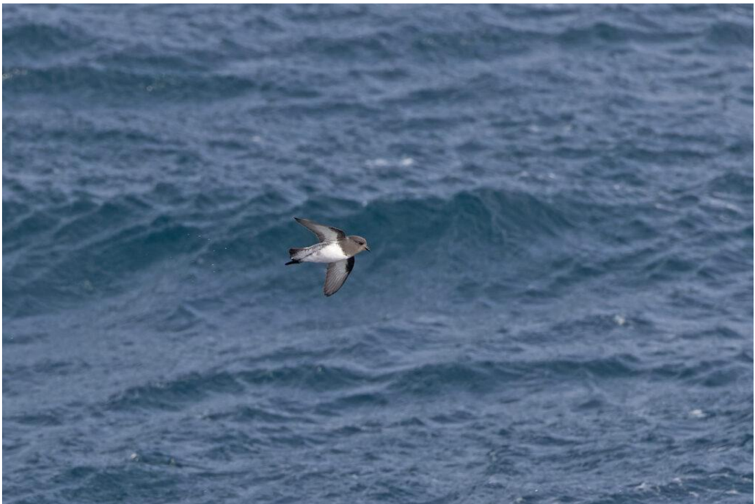
Grey-backed Storm Petrel