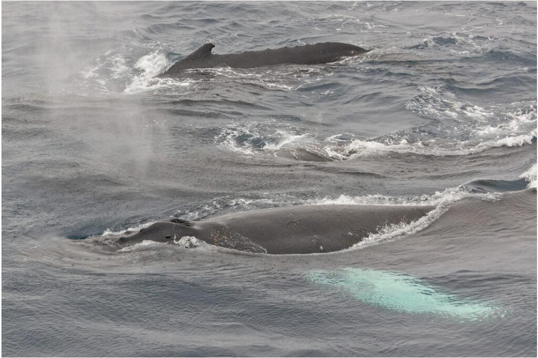
Humpback Whales