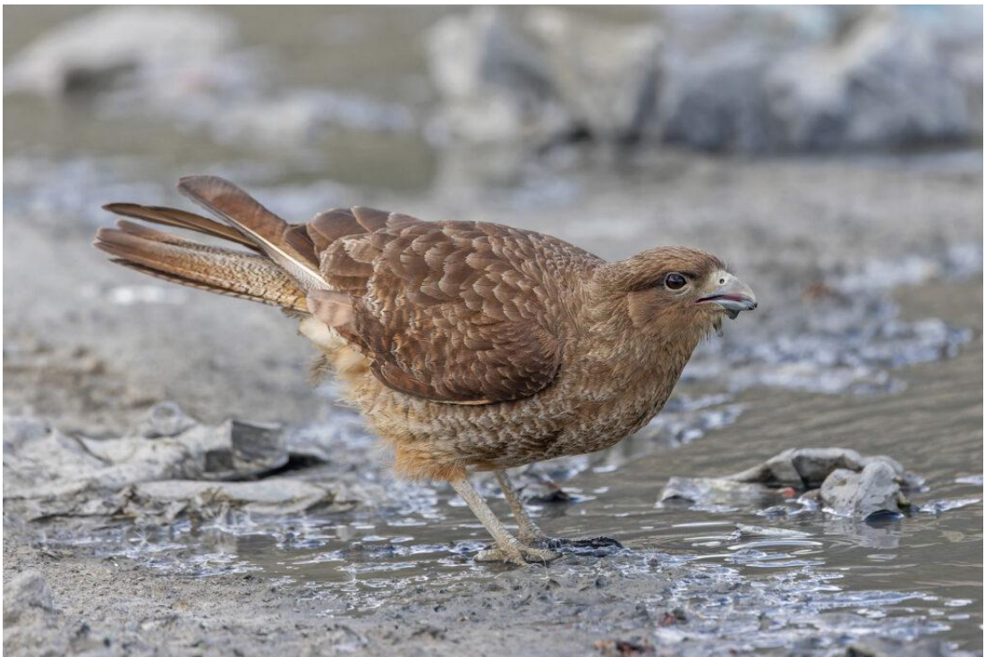
Chimango Caracara