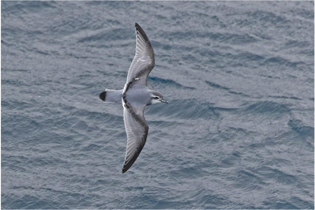
Antarctic Prion