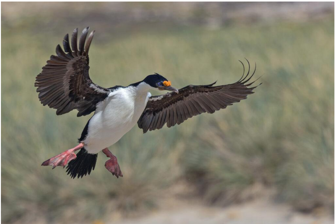
Imperial Shag