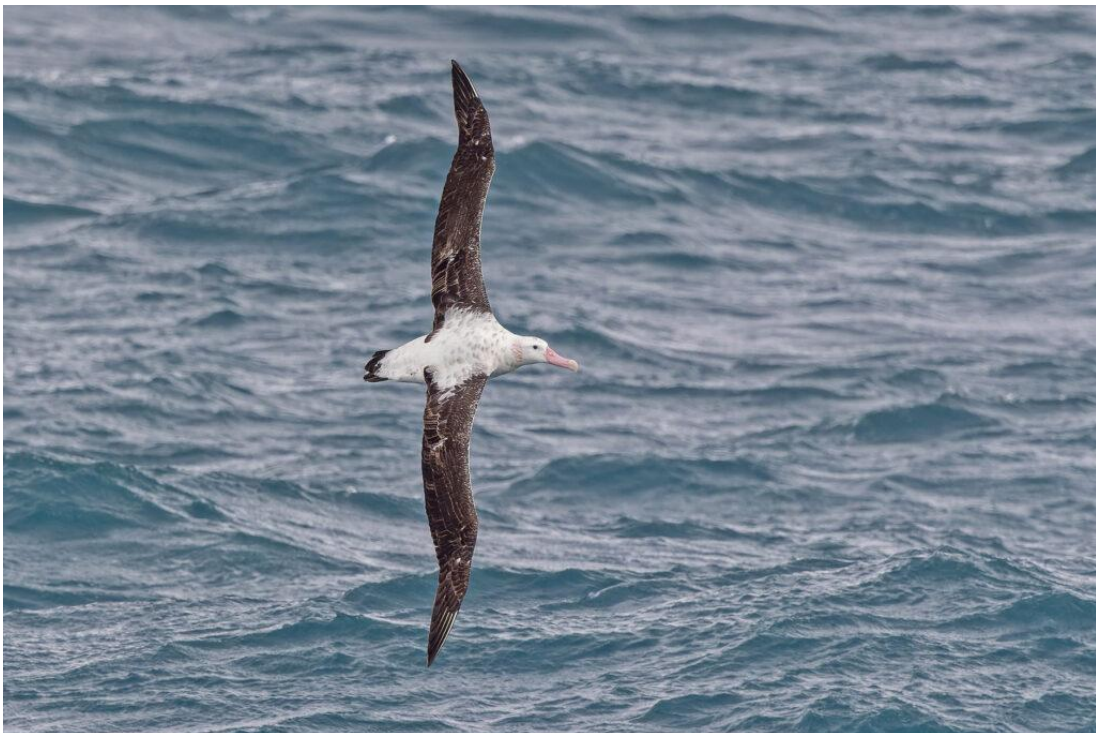
Wandering Albatross (image by Pete Morris)