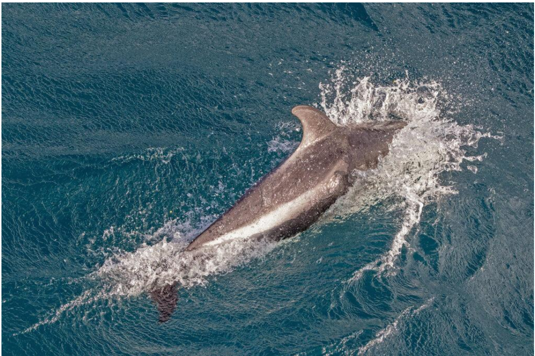
Peale's Dolphin