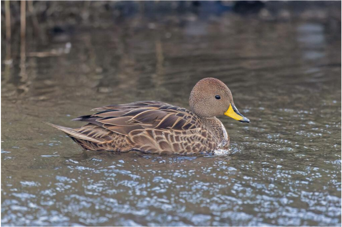
South Georgia Pintail