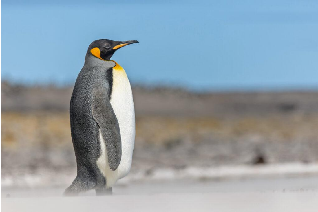
King Penguin