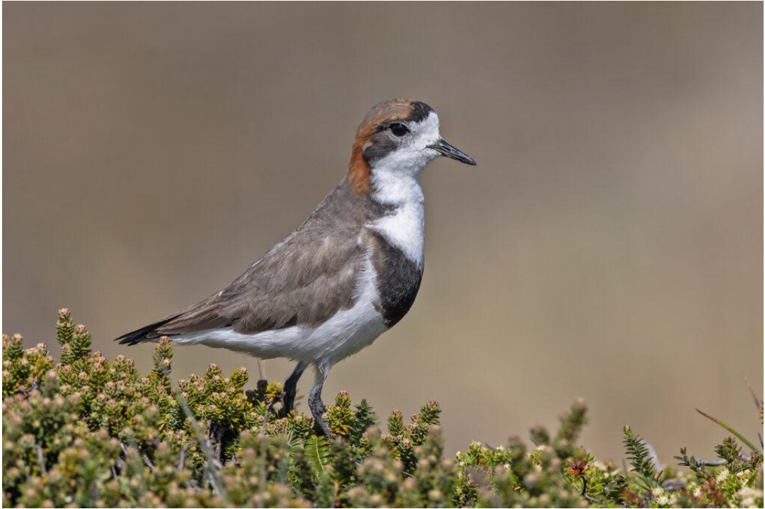
Two-banded Plover