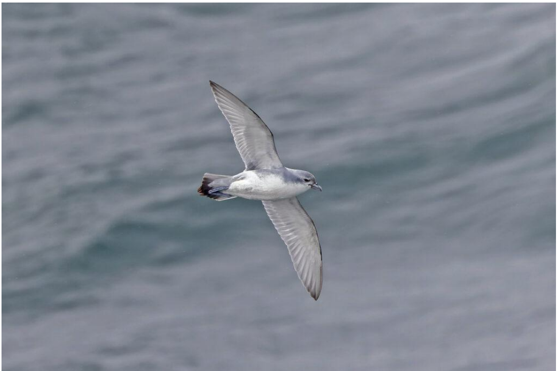
Fairy Prion