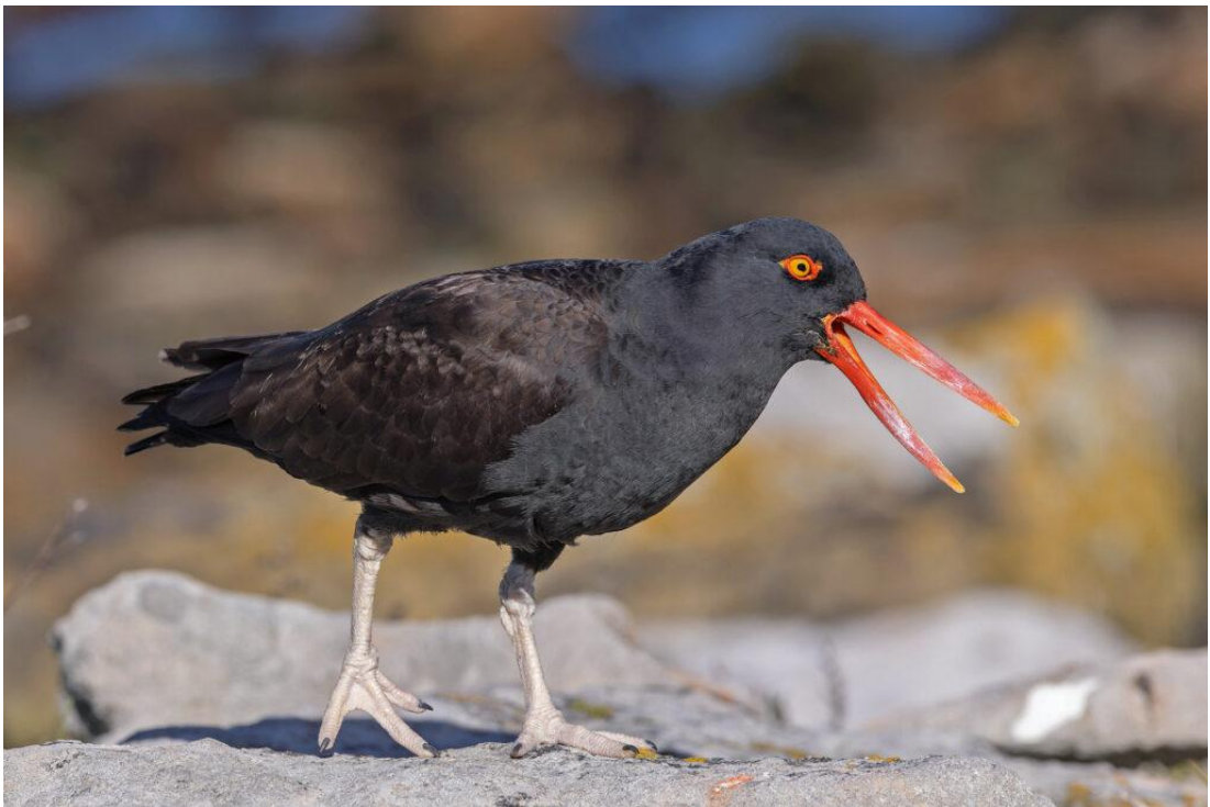
Blackish Oystercatcher