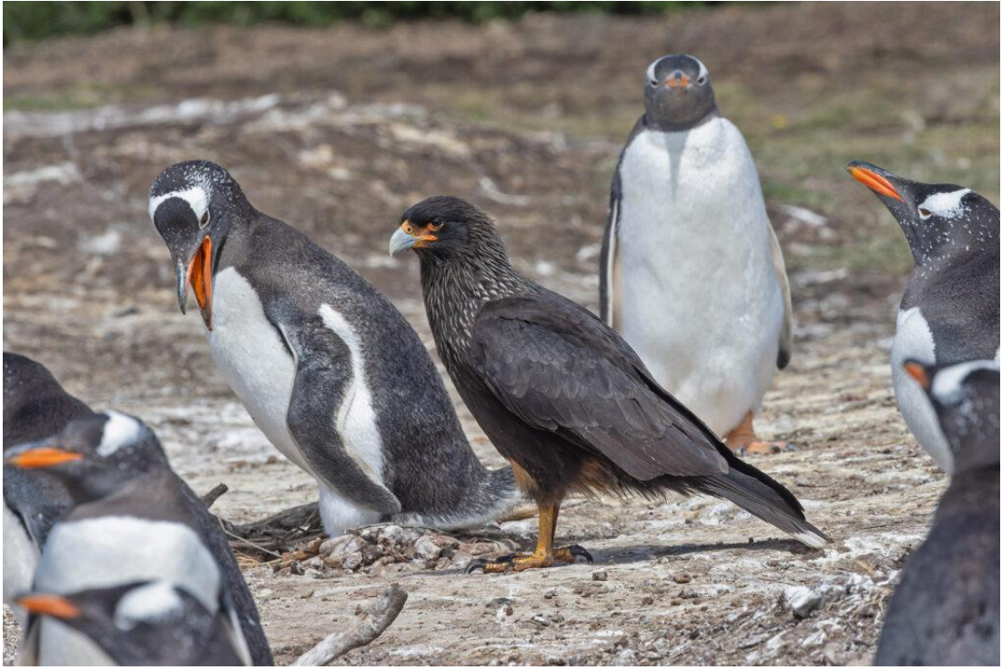
Striated Caracara