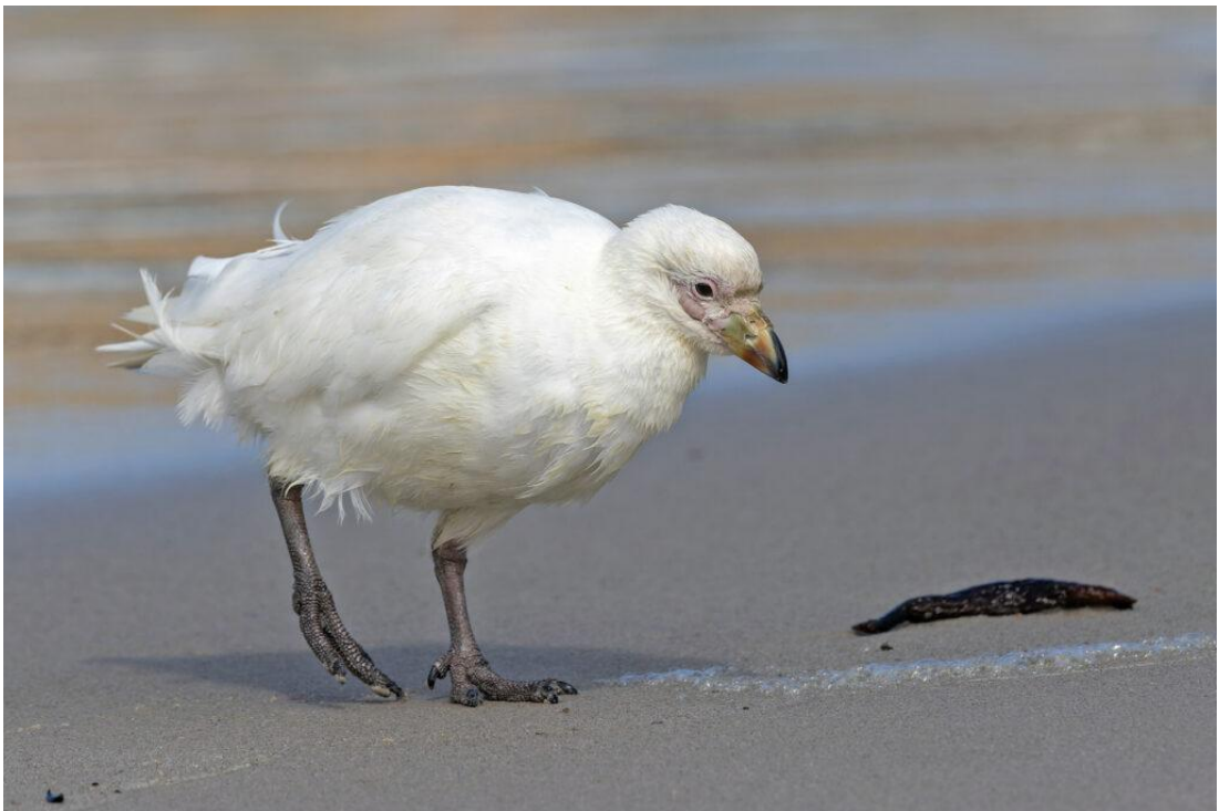
Snowy Sheathbill