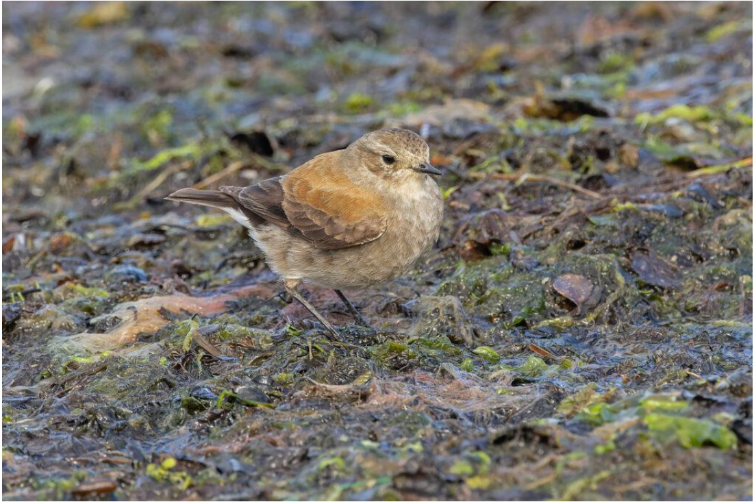
Austral Negrito