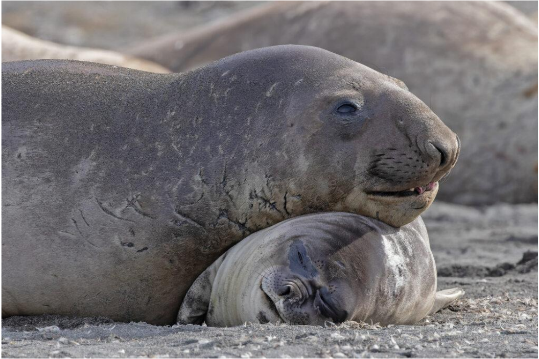
Southern Elephant Seals