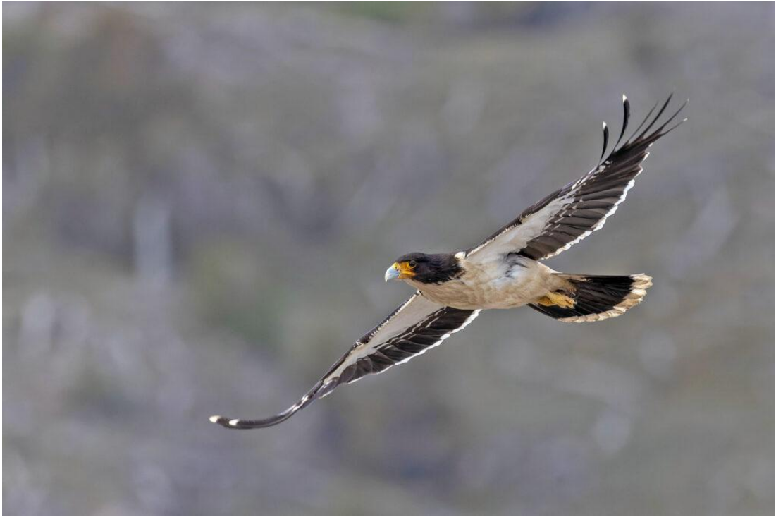
White-throated Caracara