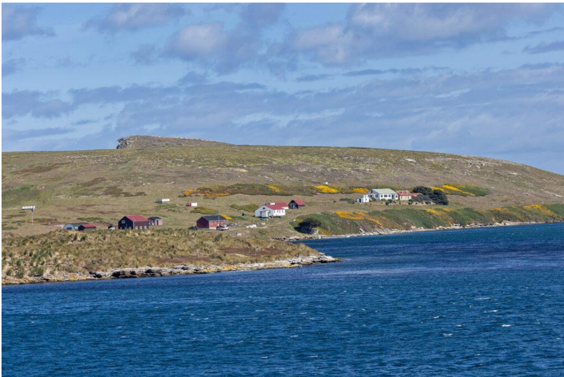
New Island