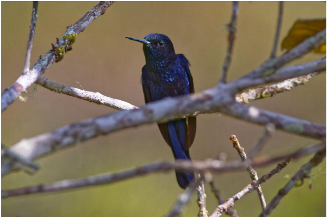
Royal Sunangel