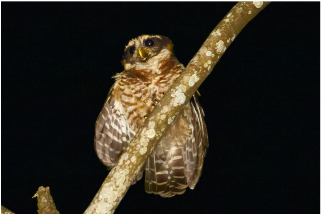
Band-bellied Owl