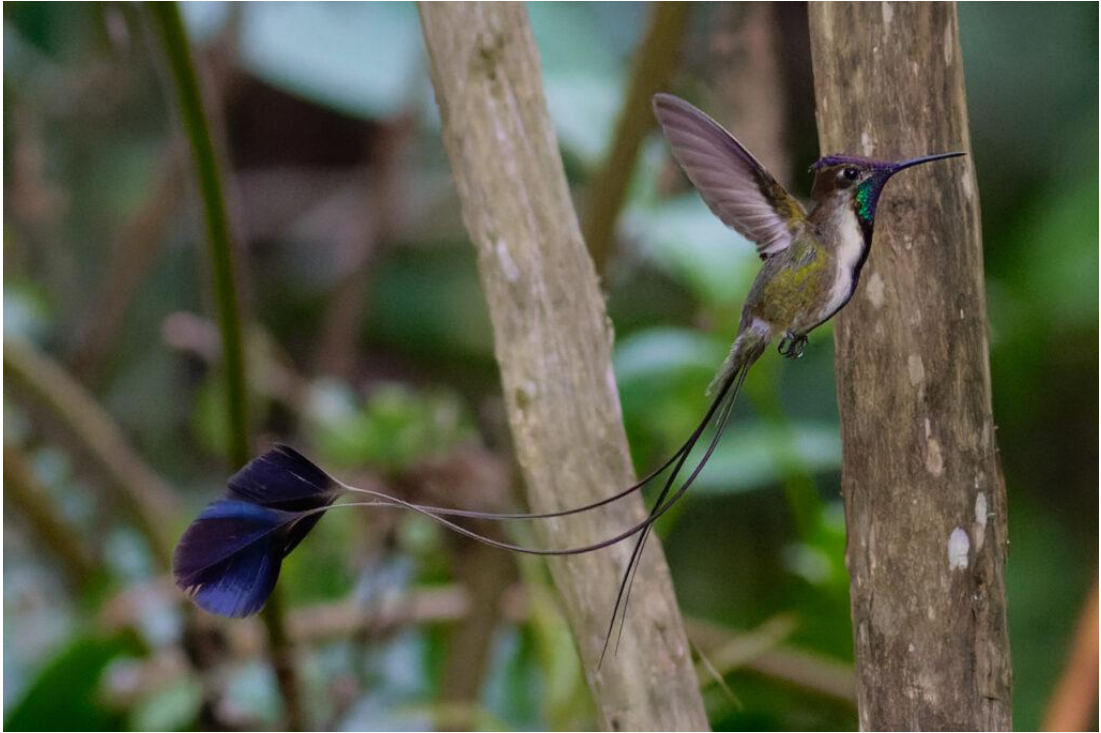
Marvelous Spatuletail