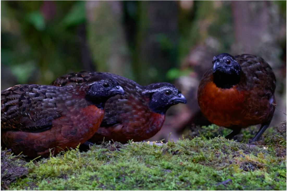
Rufous-breasted Wood Quail