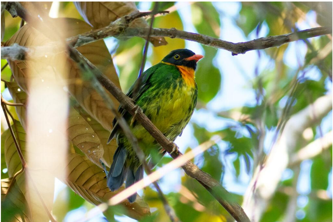
Masked Fruiteater