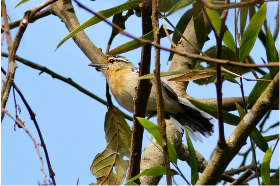
Ash-throated Antwren