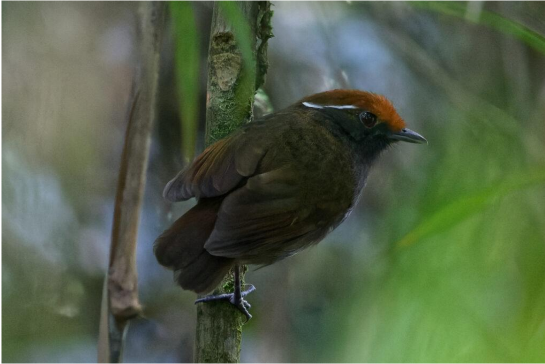
Chestnut-crowned Gnateater