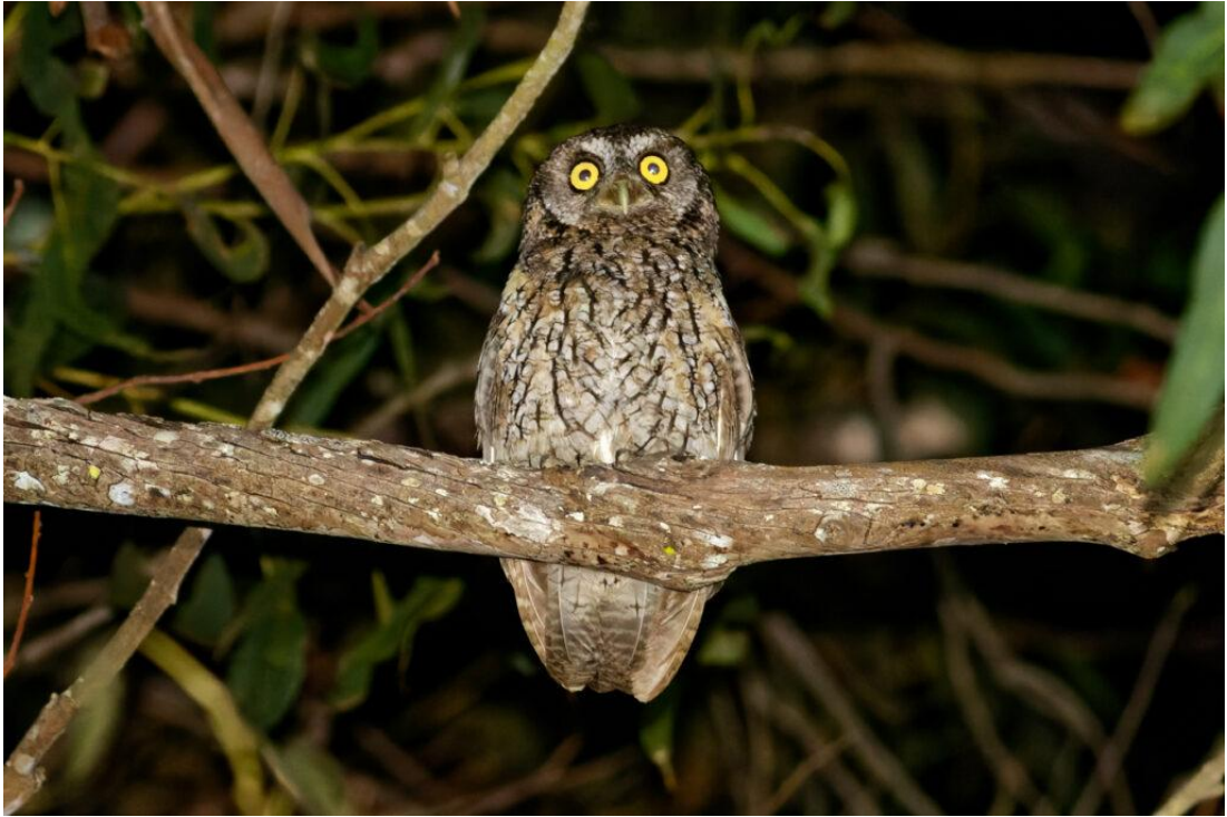
Koepcke's Screech Owl