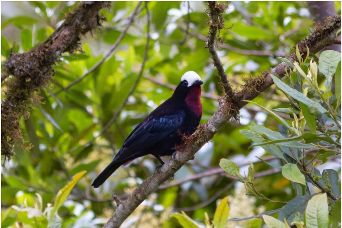
White-capped Tanager