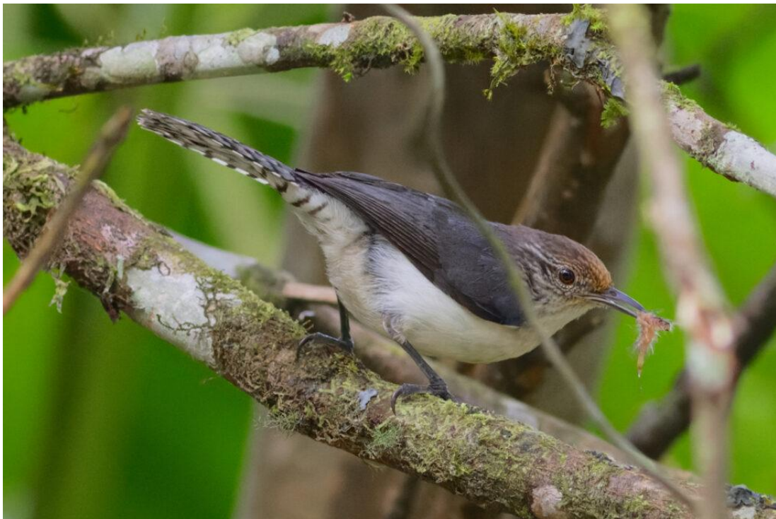
Grey-mantled Wren