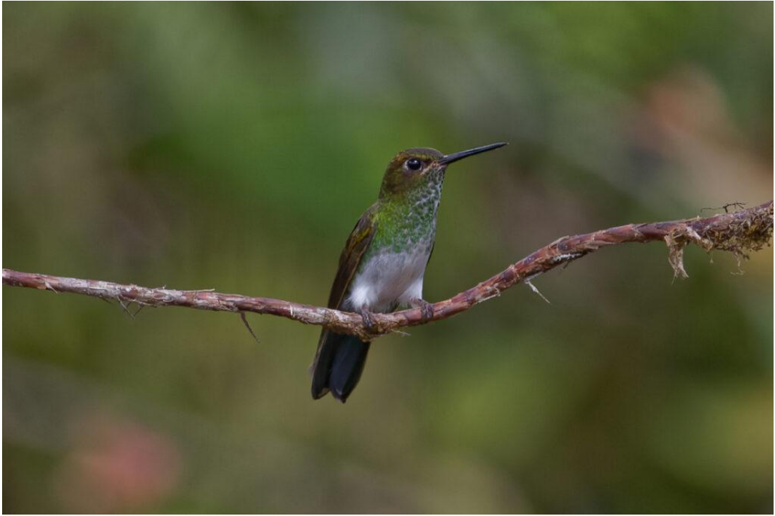
Greenish Puffleg