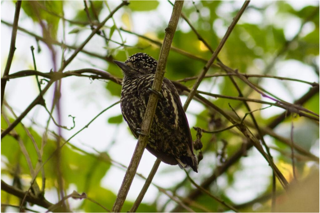
Ecuadorian Piculet