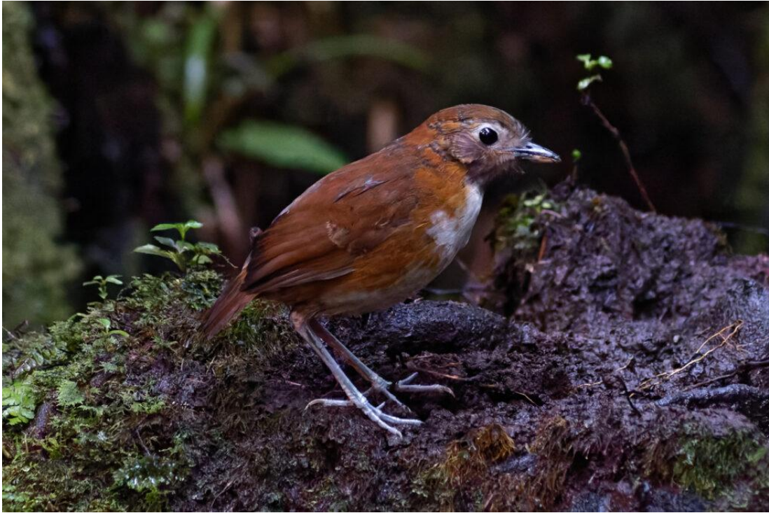
Rusty-tinged Antpitta