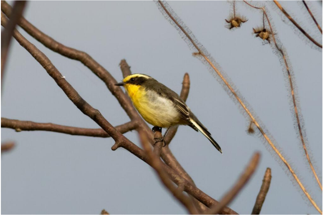
Tumbes Tyrant (image by Leo Garrigues)