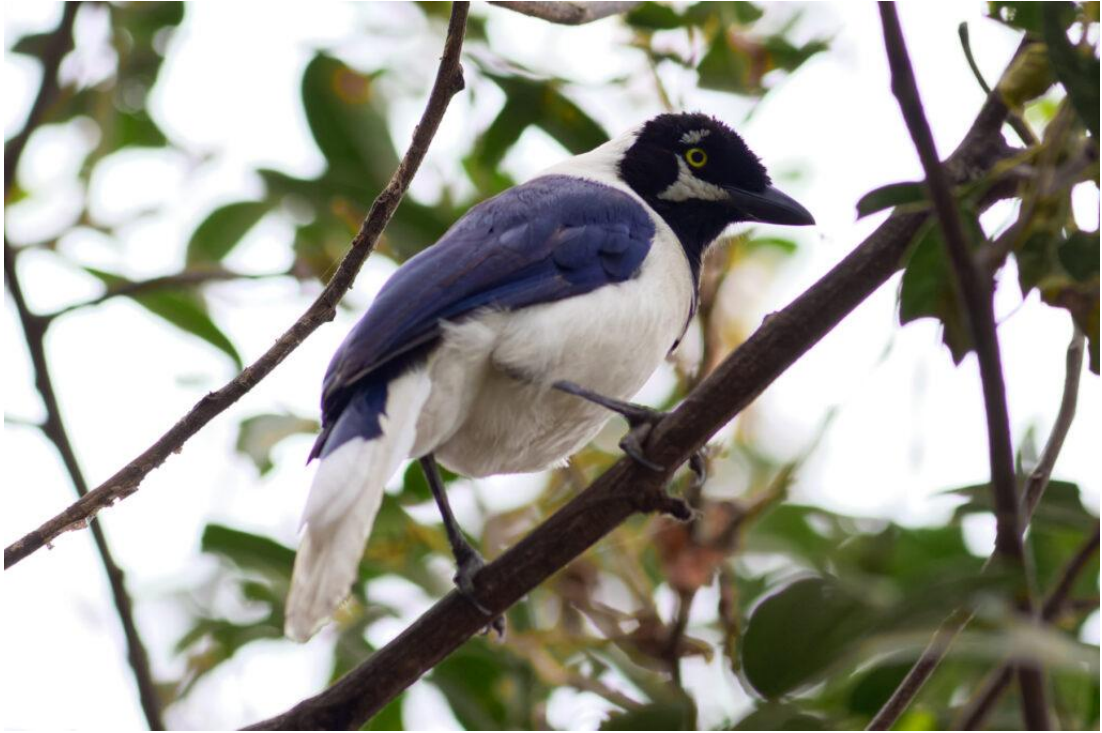
White-tailed Jay