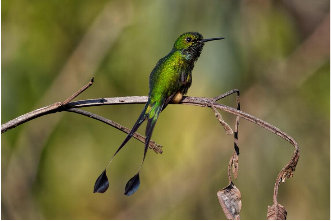
Peruvian Racket-tail