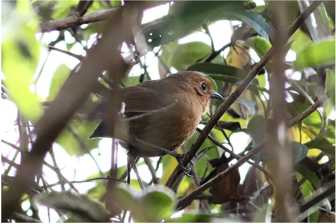
Cajamarca Antpitta