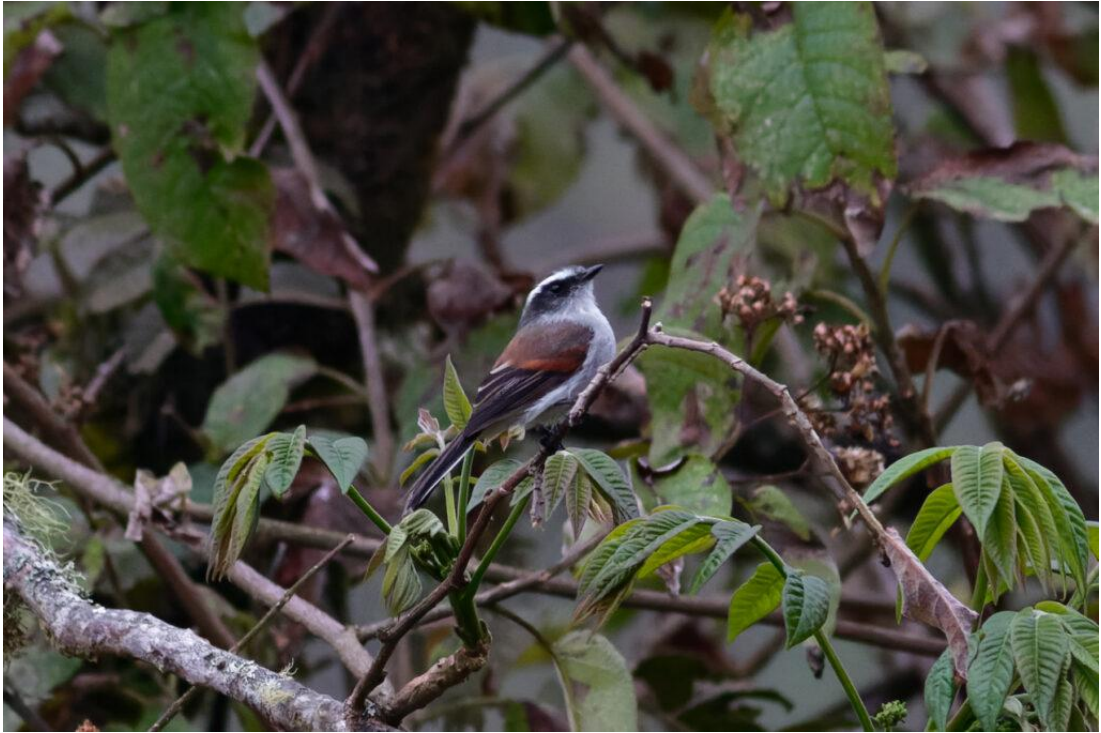
Piura Chat-Tyrant