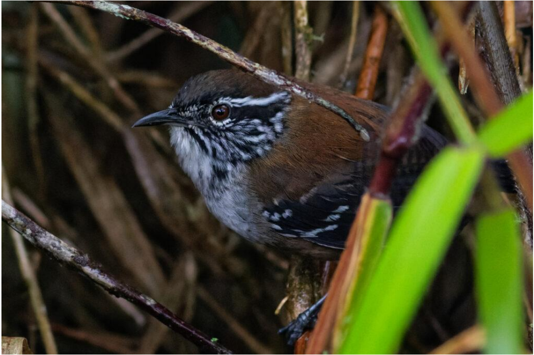
Bar-winged Wood Wren