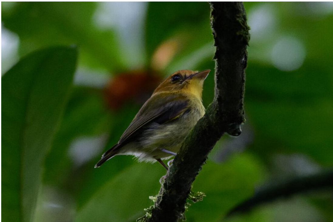
Yellow-throated Spadebill (image by Leo Garrigues)

Dolphin sp. We got some views of some dolphins from the shore at Playa Santa Rosa, but no idea what species could be.