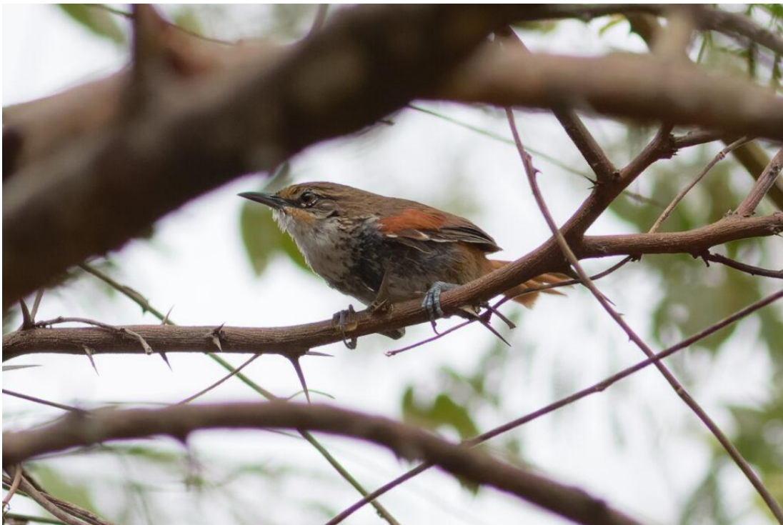
Chinchipe Spinetail (image by Leo Garrigues)