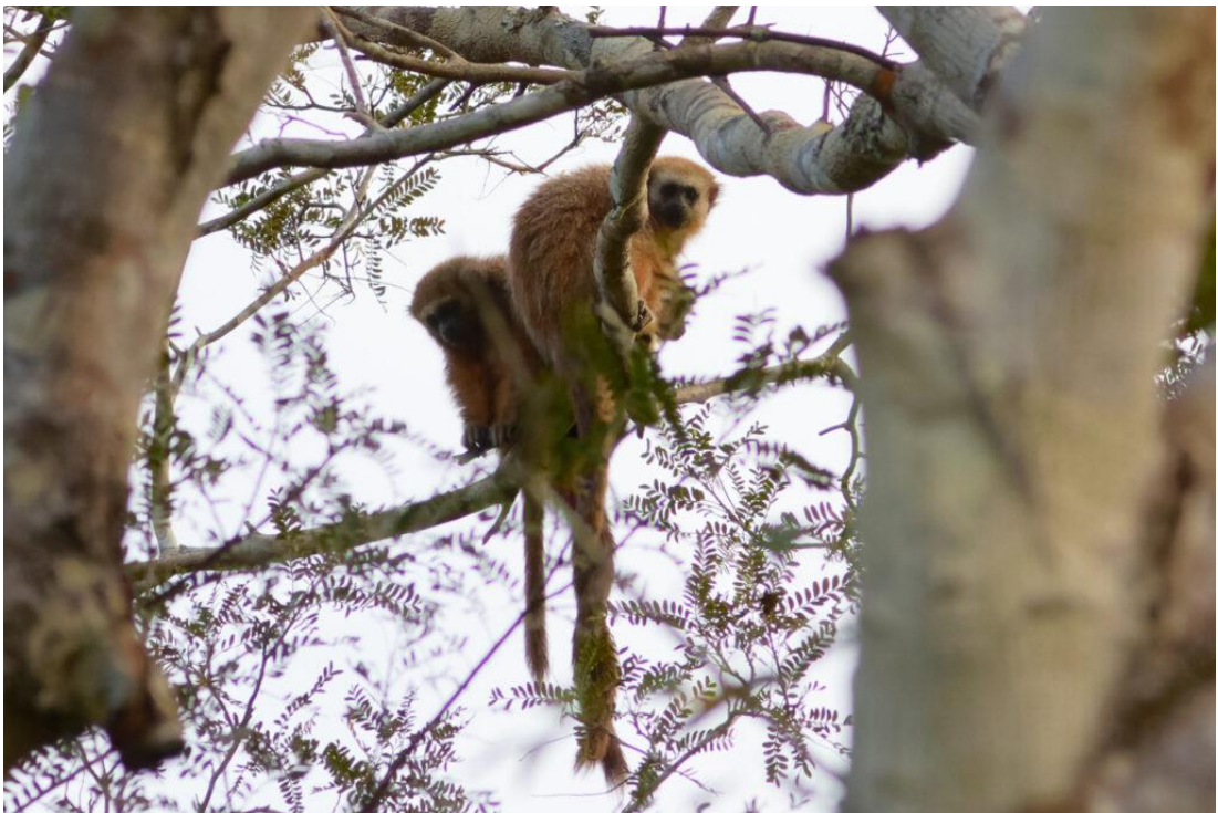
San Martin Titi Monkey