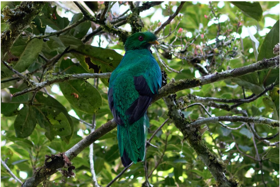
Crested Quetzal