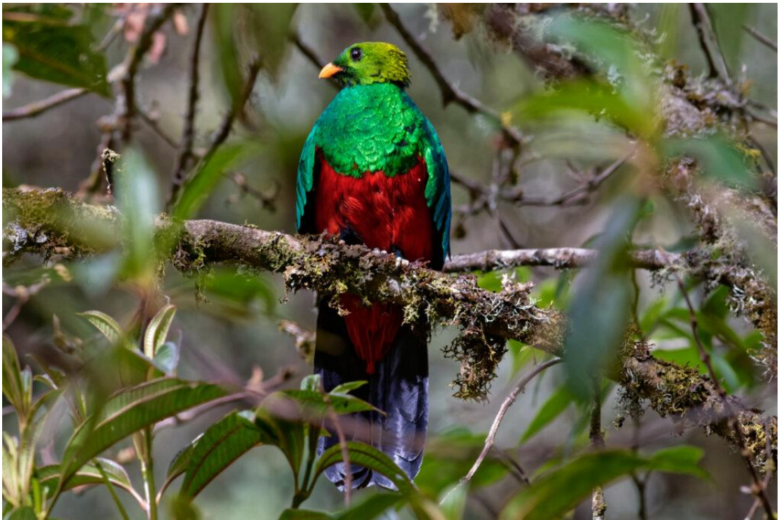
Golden-headed Quetzal