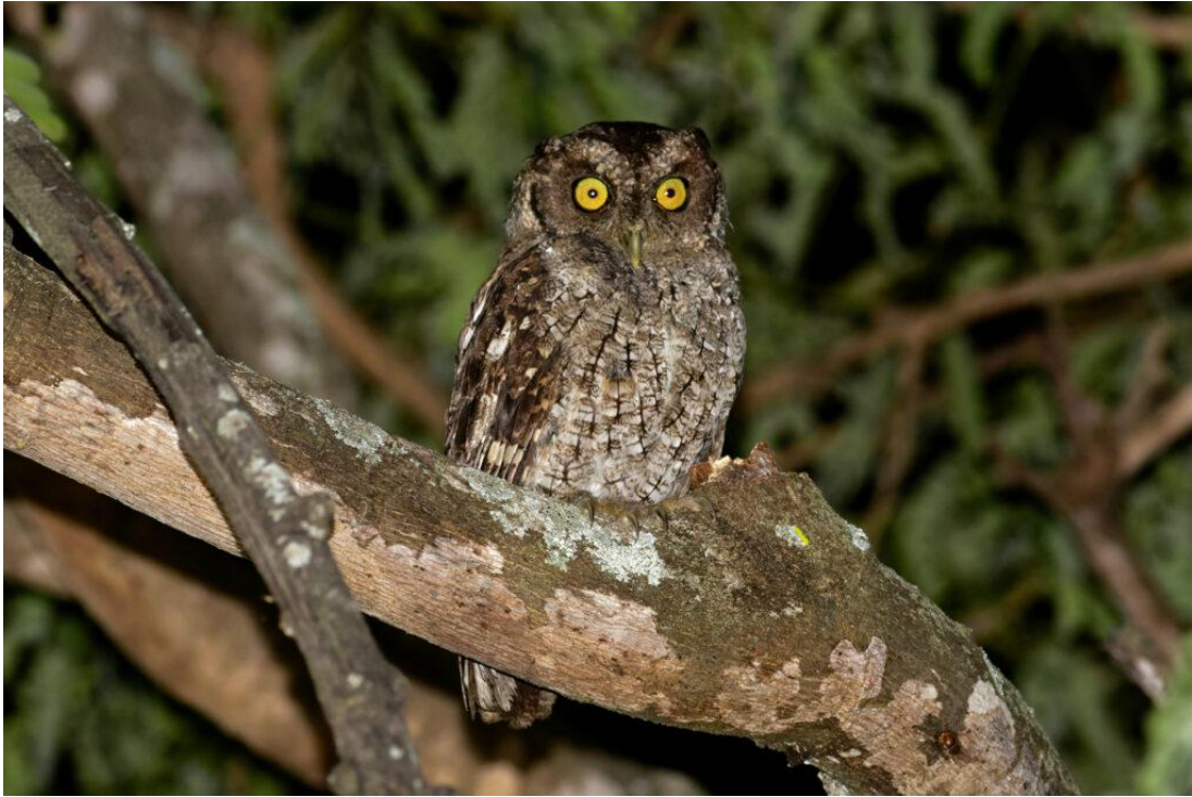
West Peruvian Screech Owl