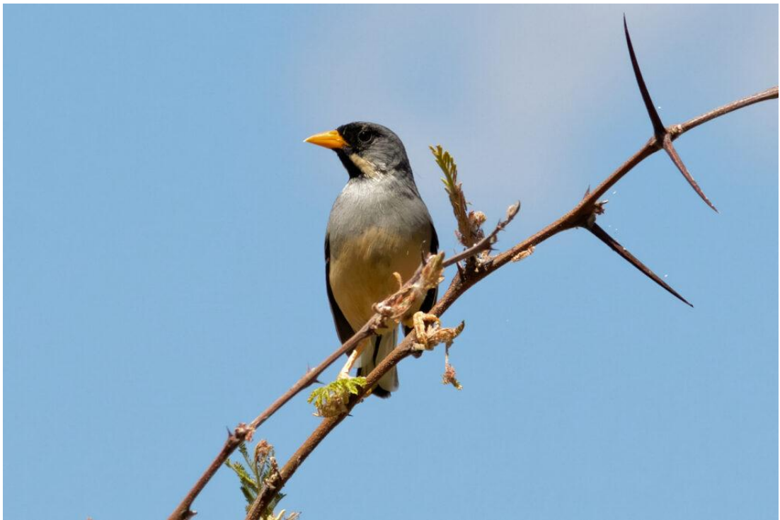
Buff-bridled Inca Finch