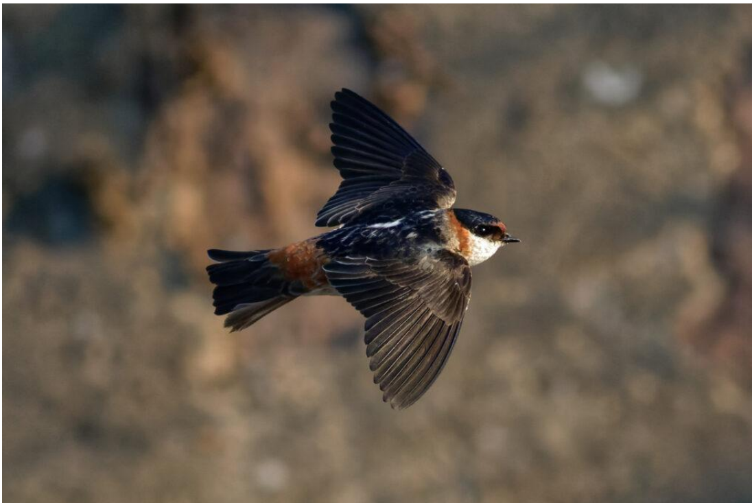
Chestnut-collared Swallow