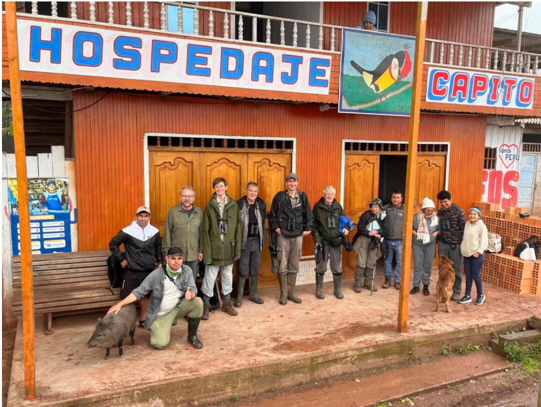
The group with a nice pet peccary