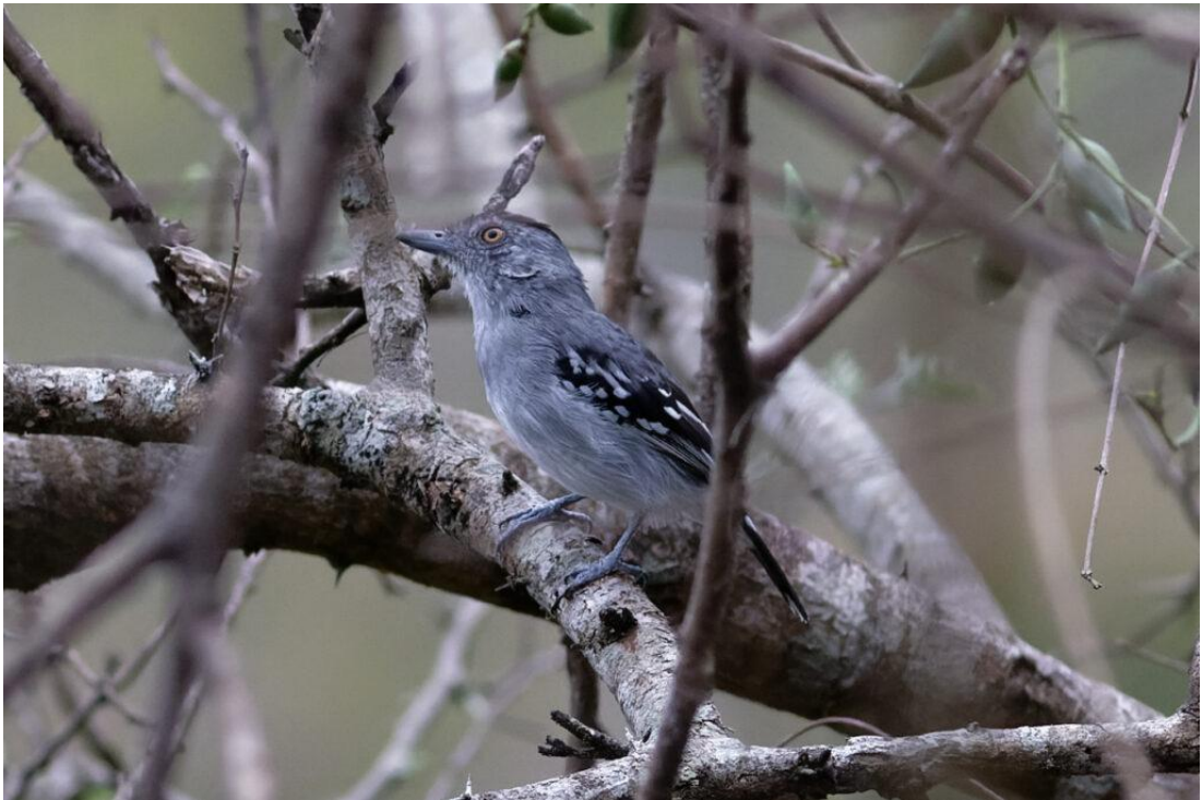
Northern (Marañon) Slaty Antshrike