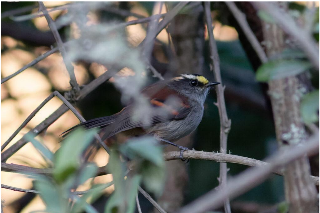
Jelski's Chat-Tyrant