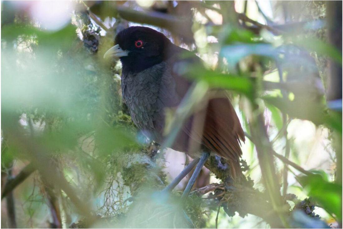
Pale-billed Antpitta