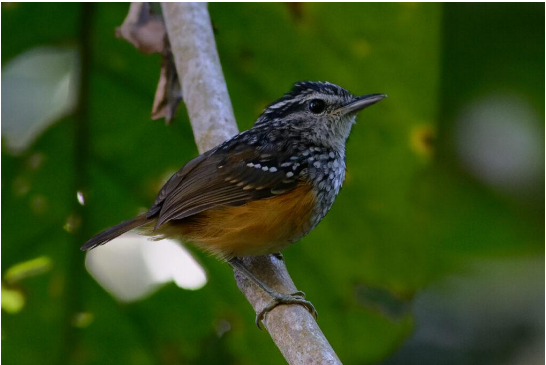
Peruvian Warbling Antbird