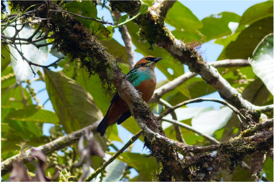
Golden-eared Tanager