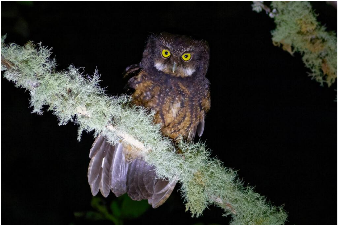
White-throated Screech Owl