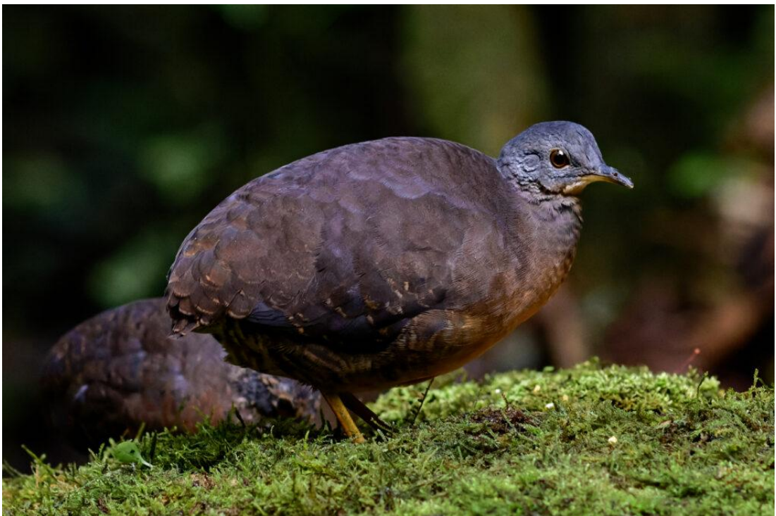
Little Tinamou