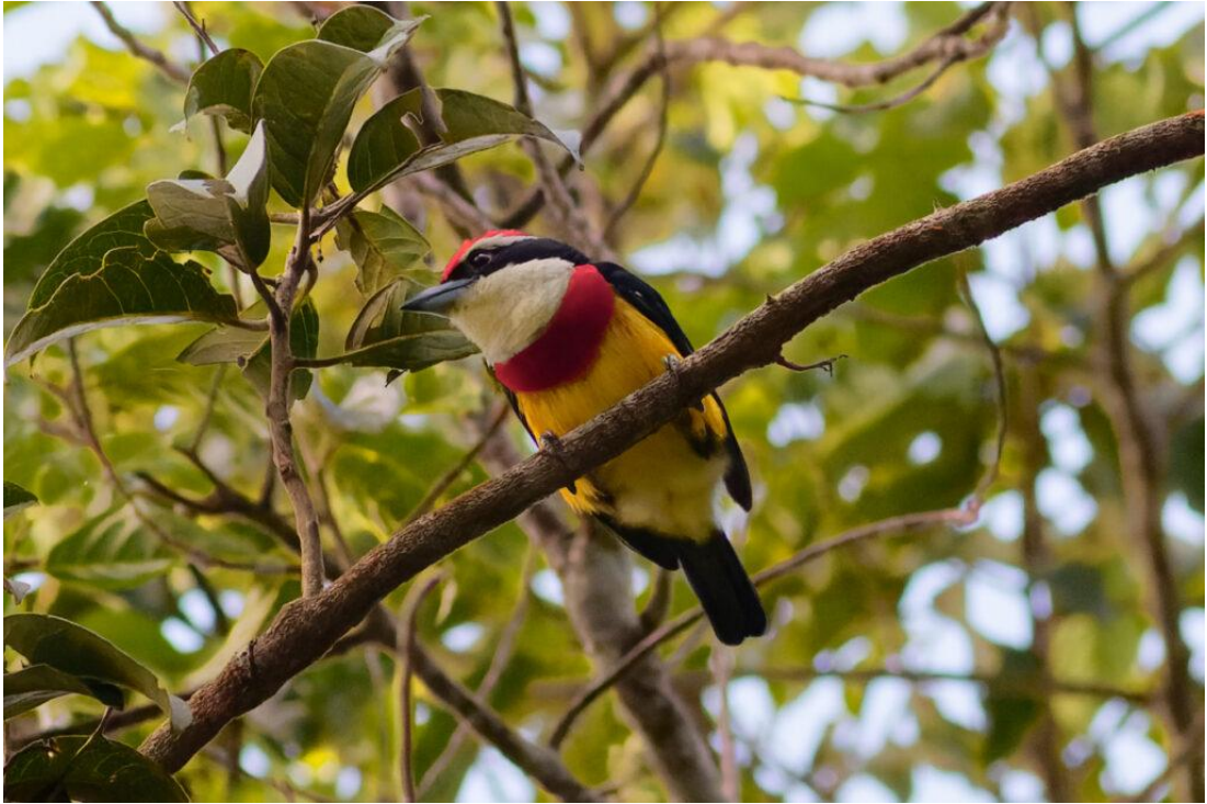
Scarlet-banded Barbet (image by Leo Garrigues)