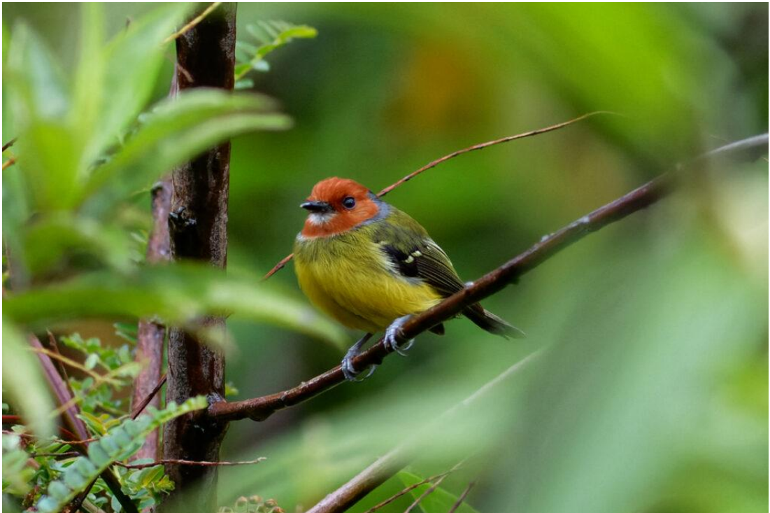
Lulu's Tody-Flycatcher