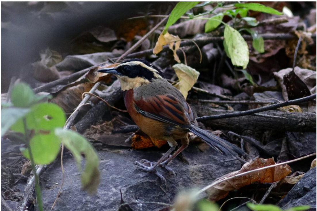
Elegant Crescentchest