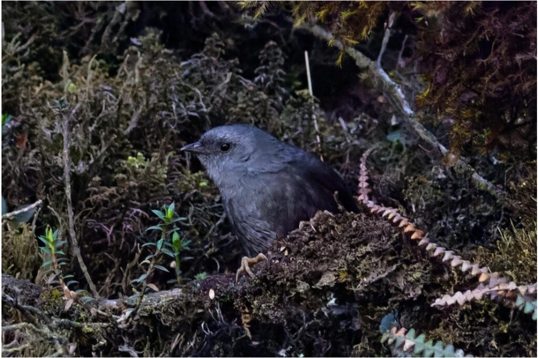
Neblina Tapaculo