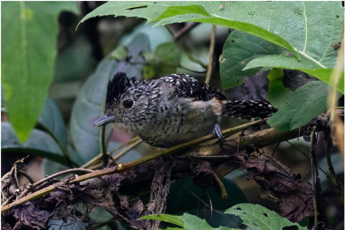
Chapman's Antshrike