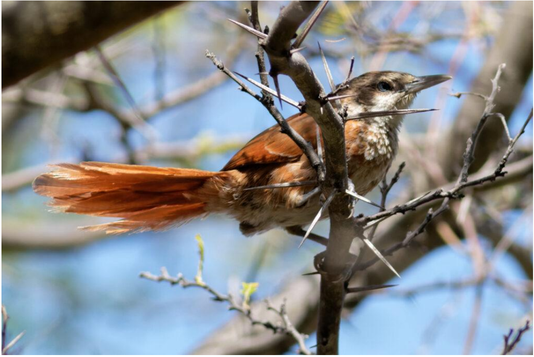
Chestnut-backed Thornbird