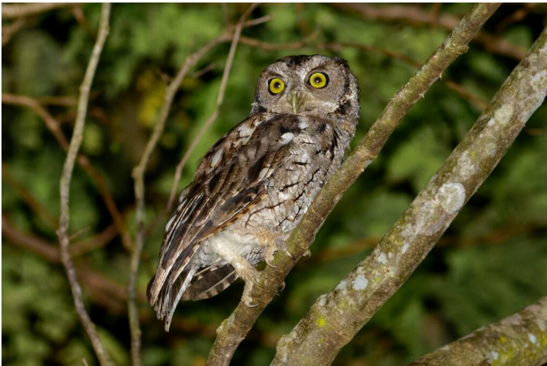
West Peruvian (Marañon) Screech Owl