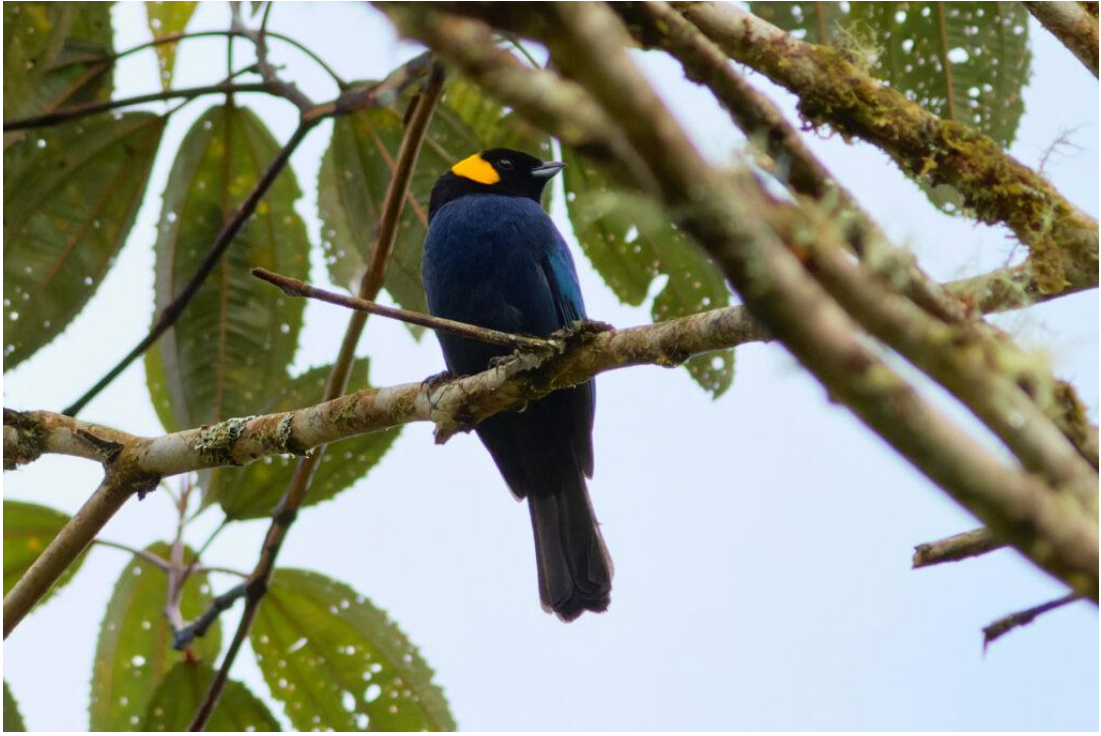
Yellow-scarfed Tanager