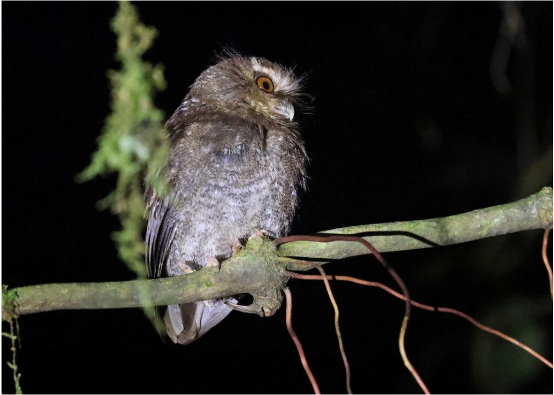
Long-whiskered Owlet