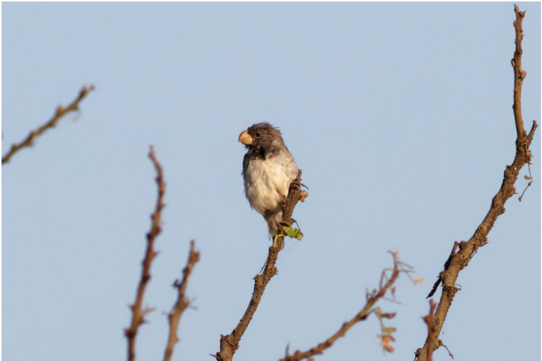
Parrot-billed Seedeater