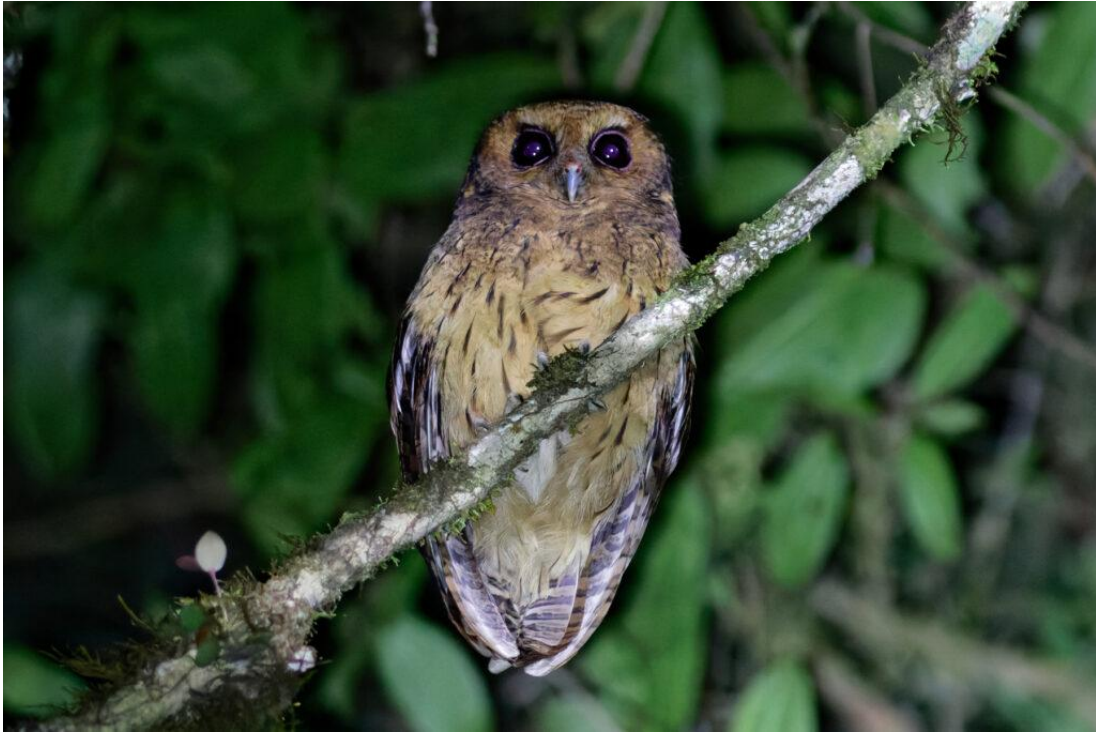
Cinnamon Screech Owl