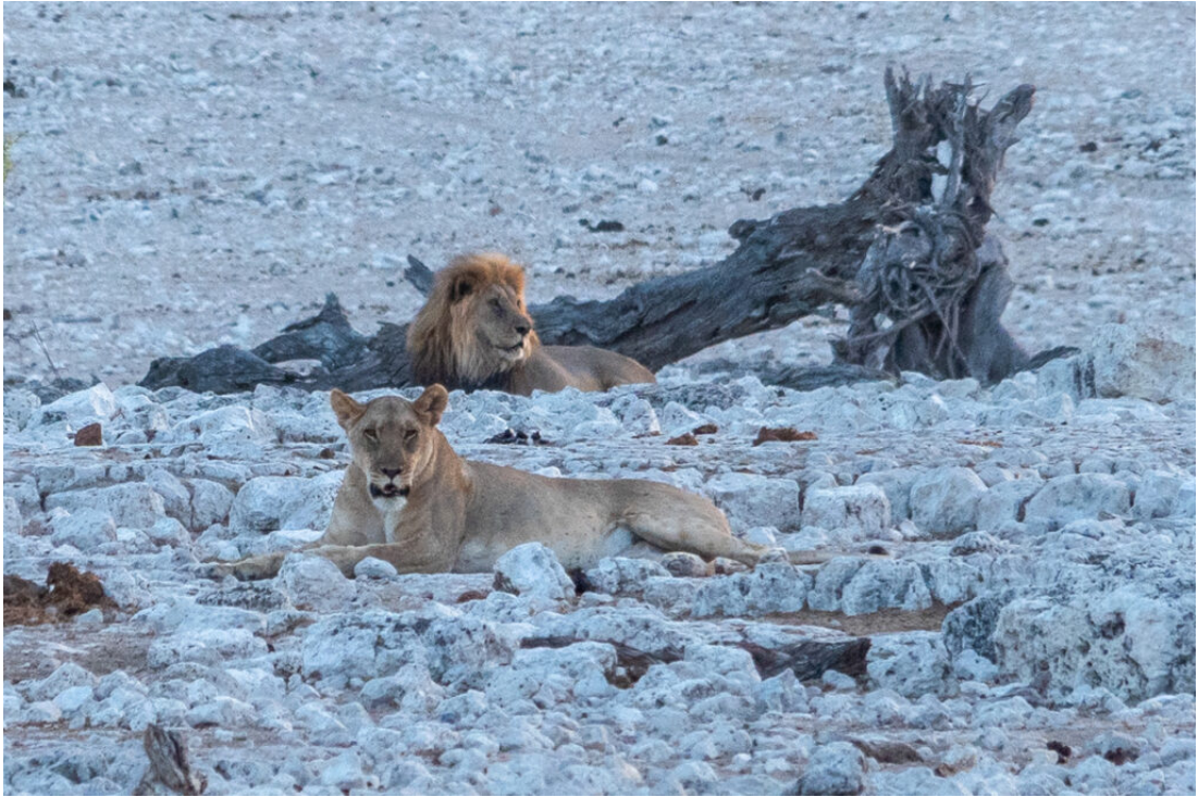
Lions at Okaukeujo