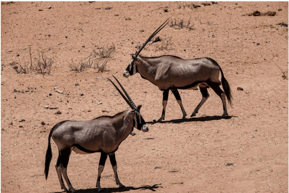
Gemsbok