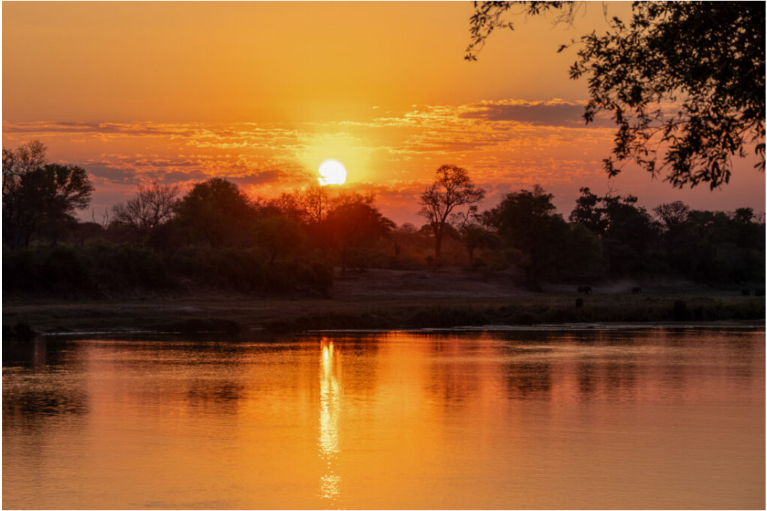
Okavango sunset