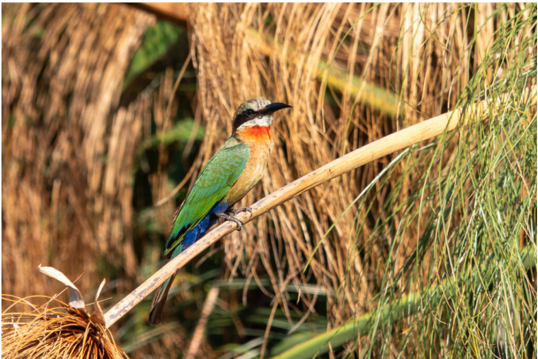
White-fronted Bee-eater