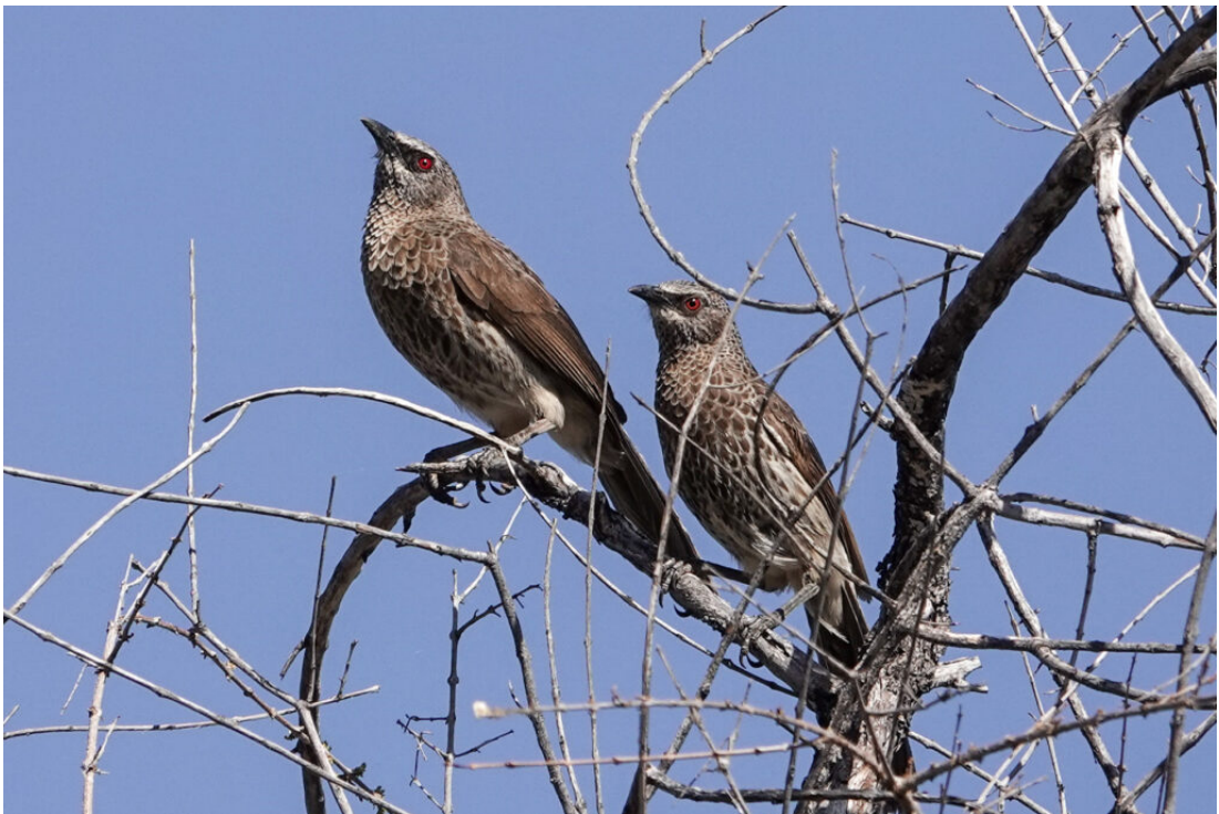
Hartlaub's Babbler