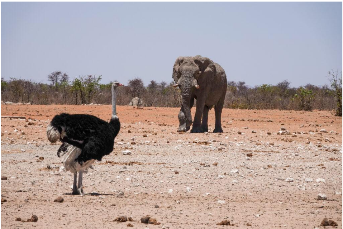
Common Ostrich meets Elephant in Ethosa