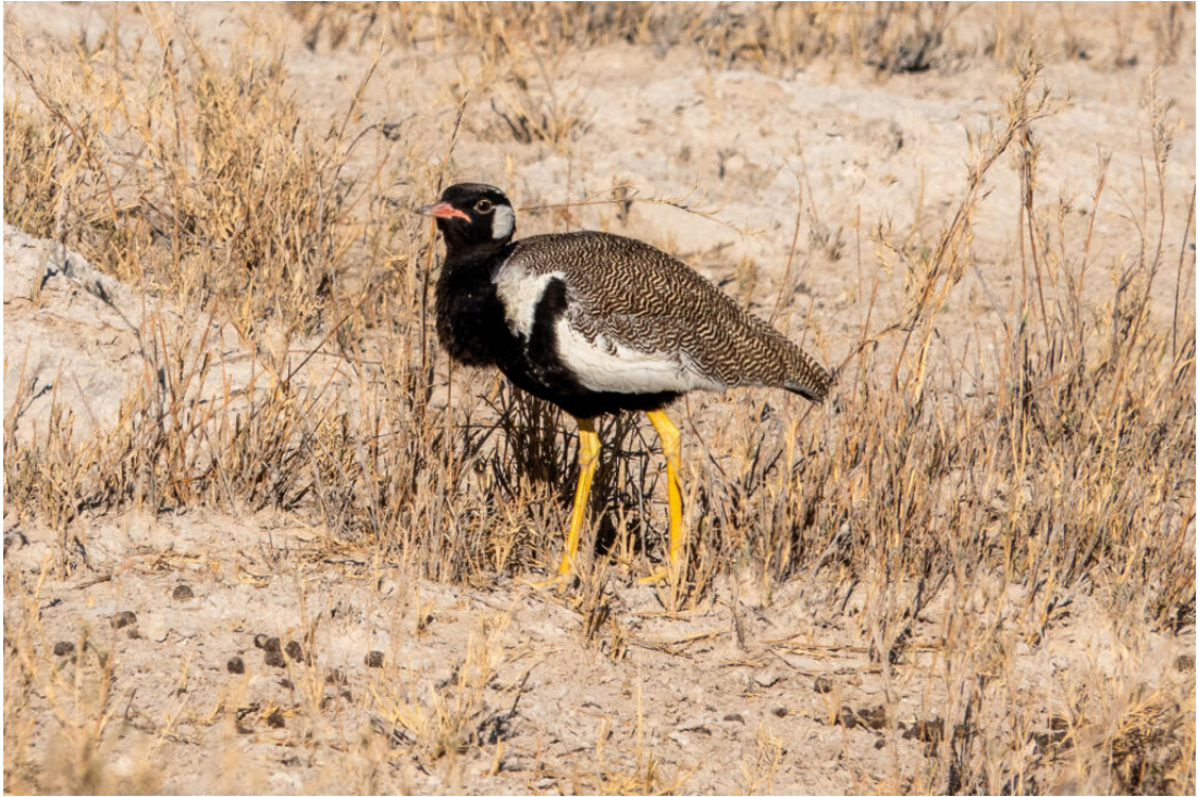
Northern Black Korhaan