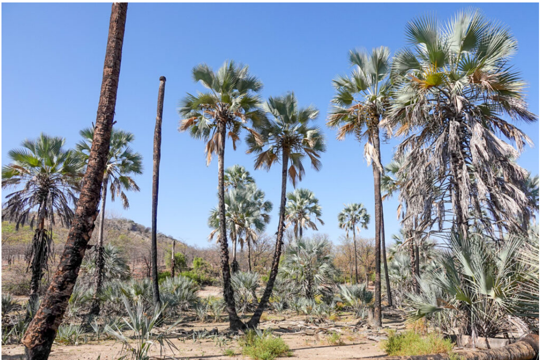
Palms along the Kunene River