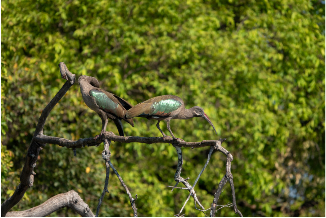
Hadada Ibis