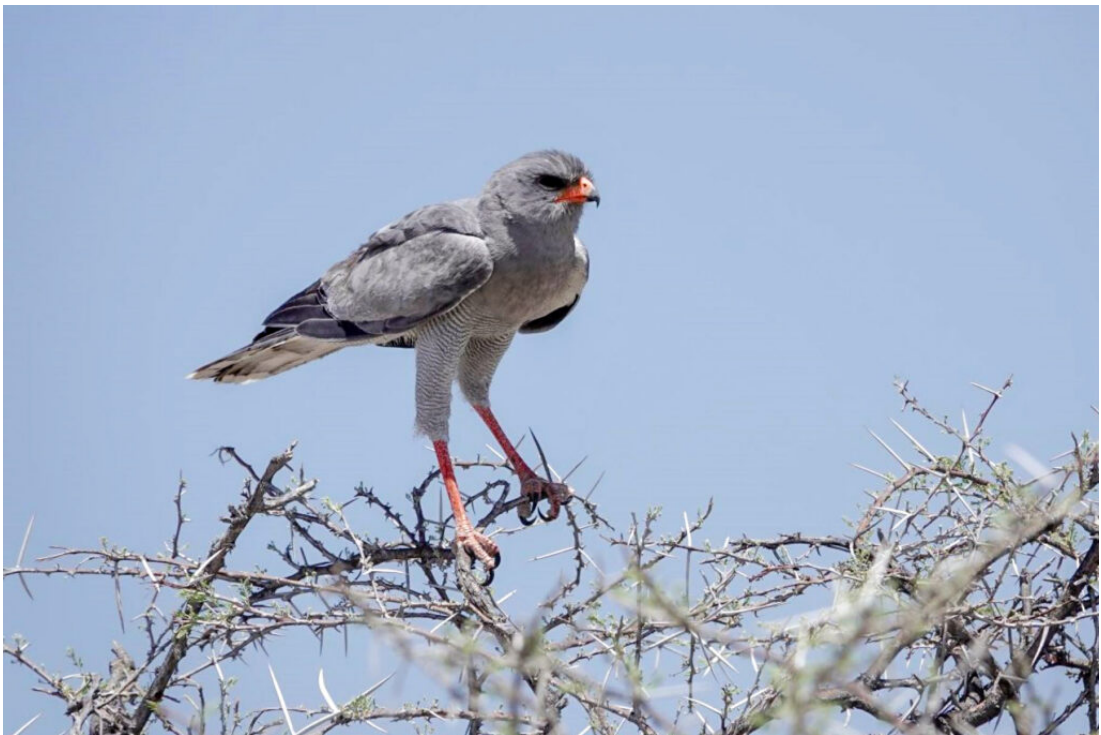
Pale Chanting Goshawk