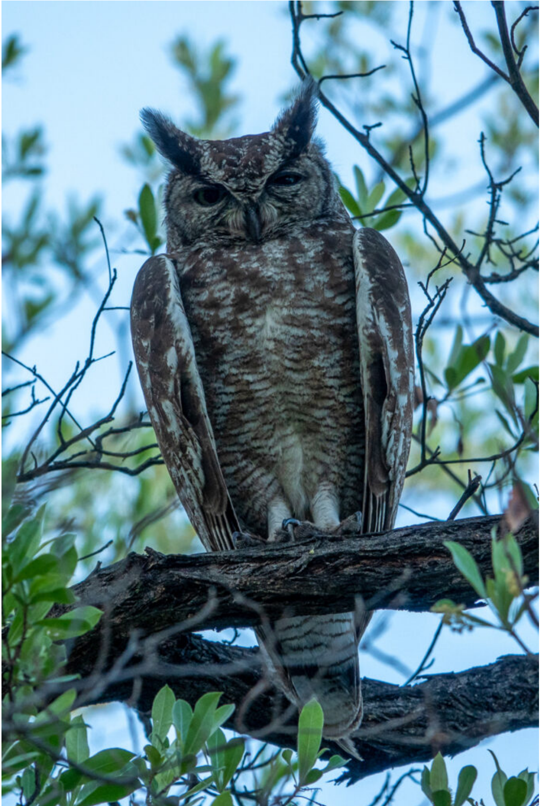
Spotted Eagle-Owl