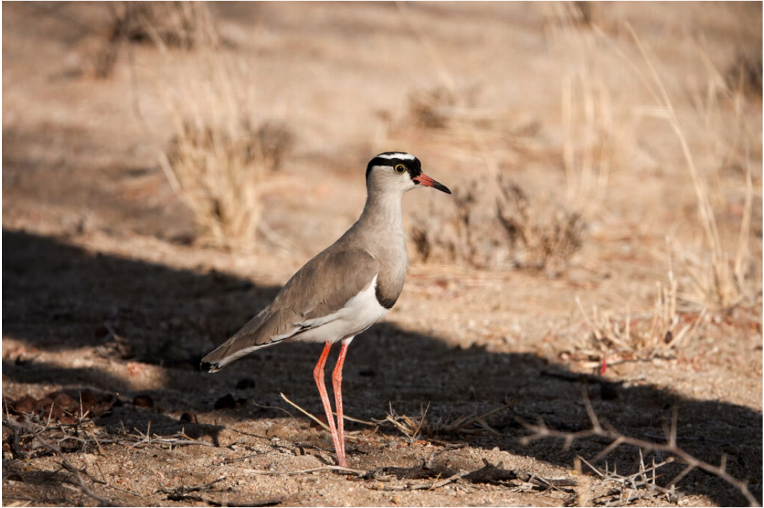
Crowned Lapwing