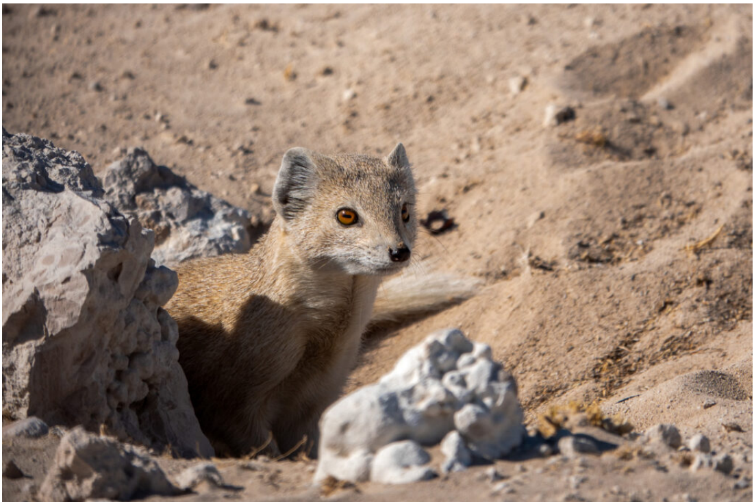
Yellow Mongoose