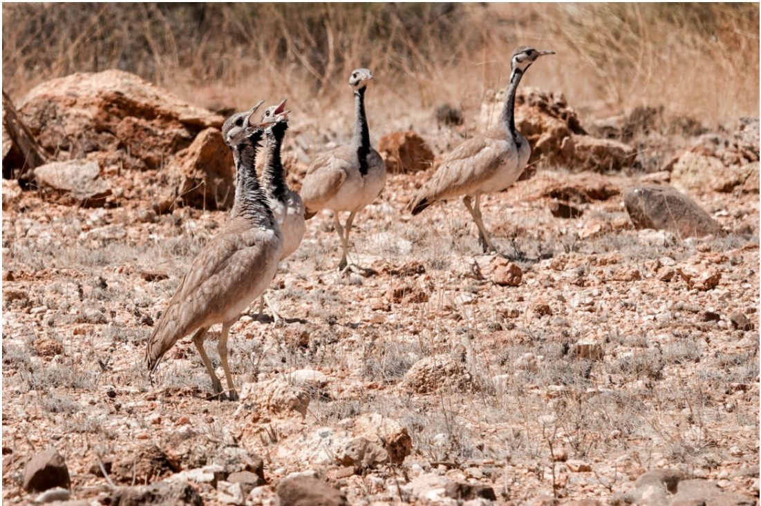
Rüppell's Korhaans in the Namib