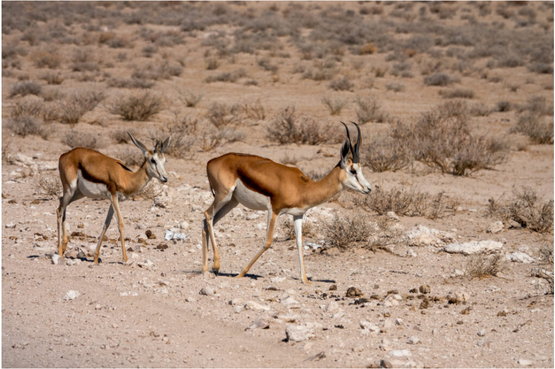
Springbok