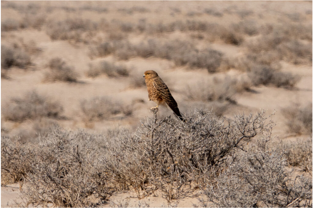
Greater Kestrel