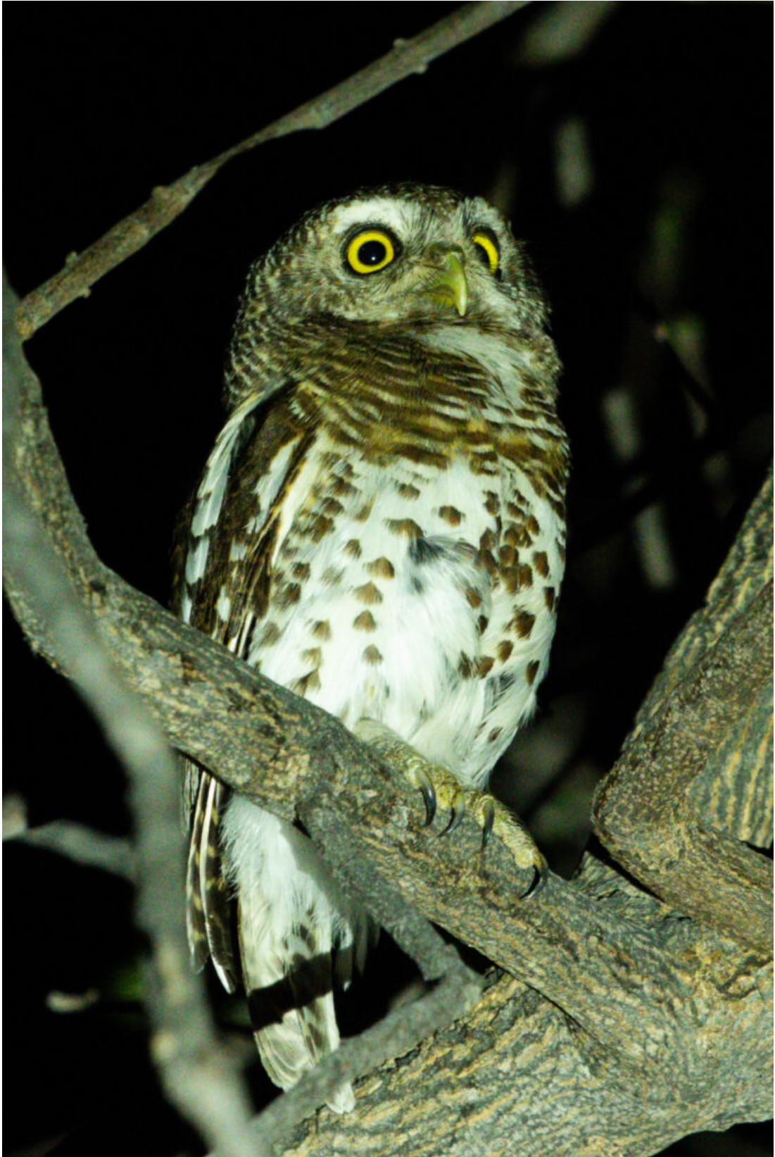
African Barred Owl