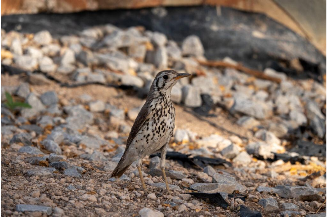
Groundscraper Thrush