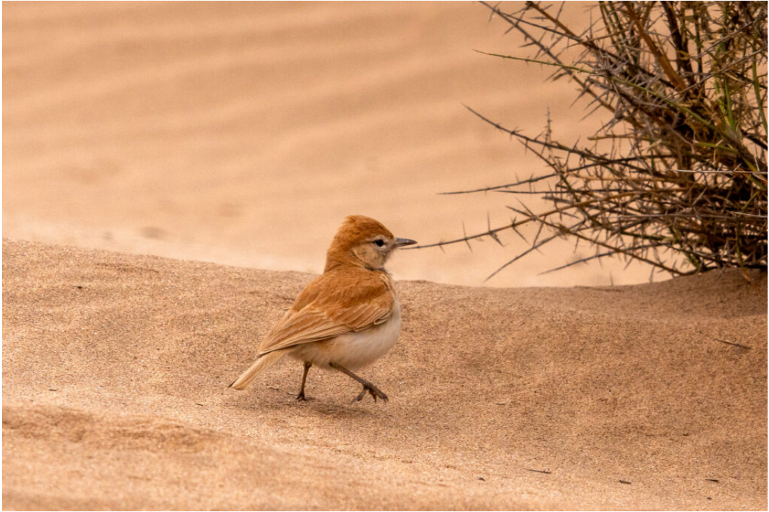
Dune Lark