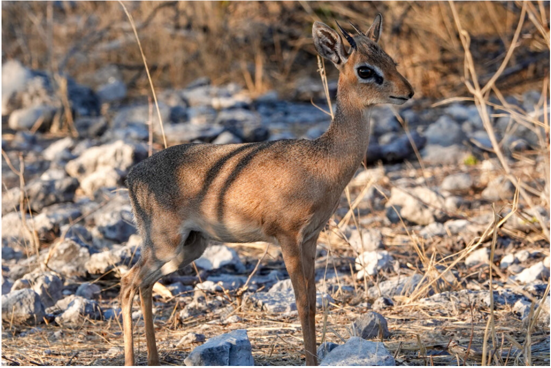
Damara Dikdik