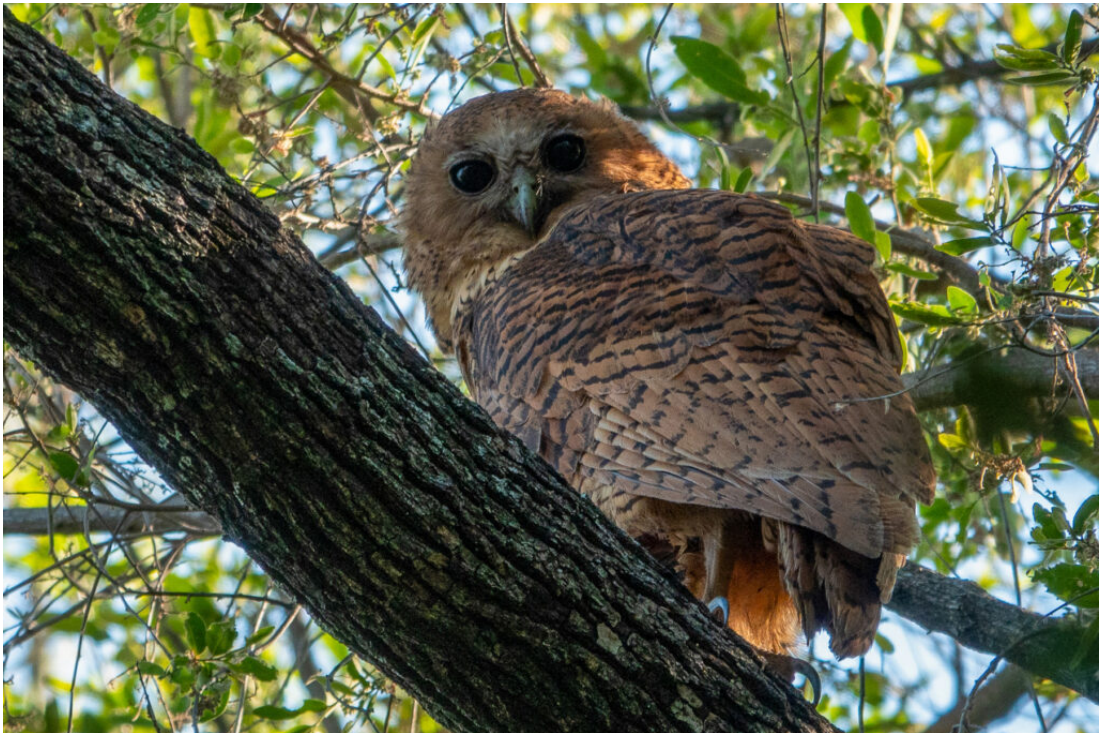
Pel's Fishing Owl