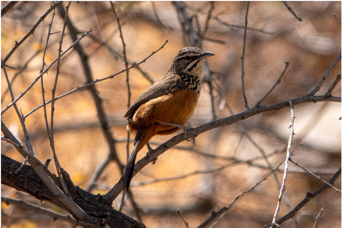
Rockrunner at Avis Dam