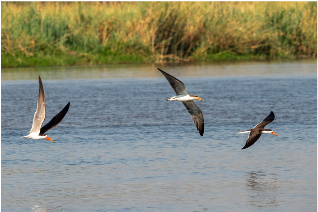
African Skimmer