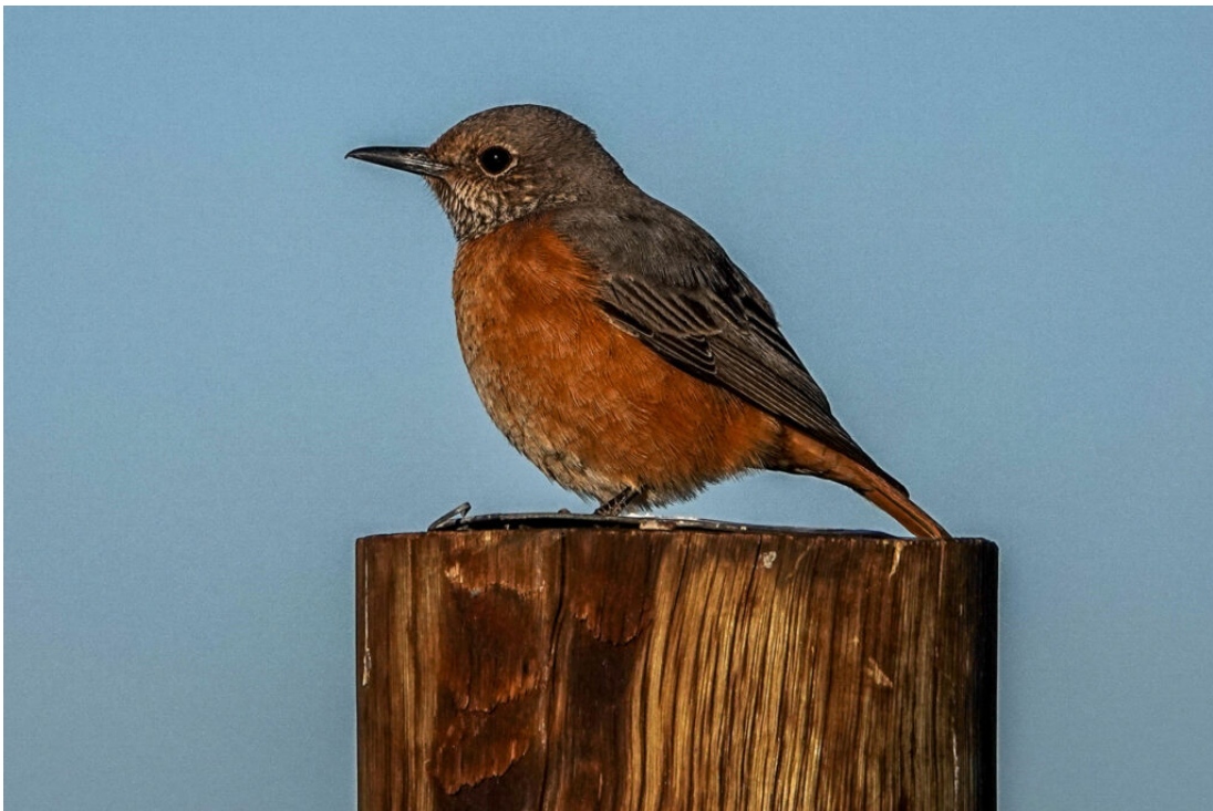
Short-toed Rock Thrush