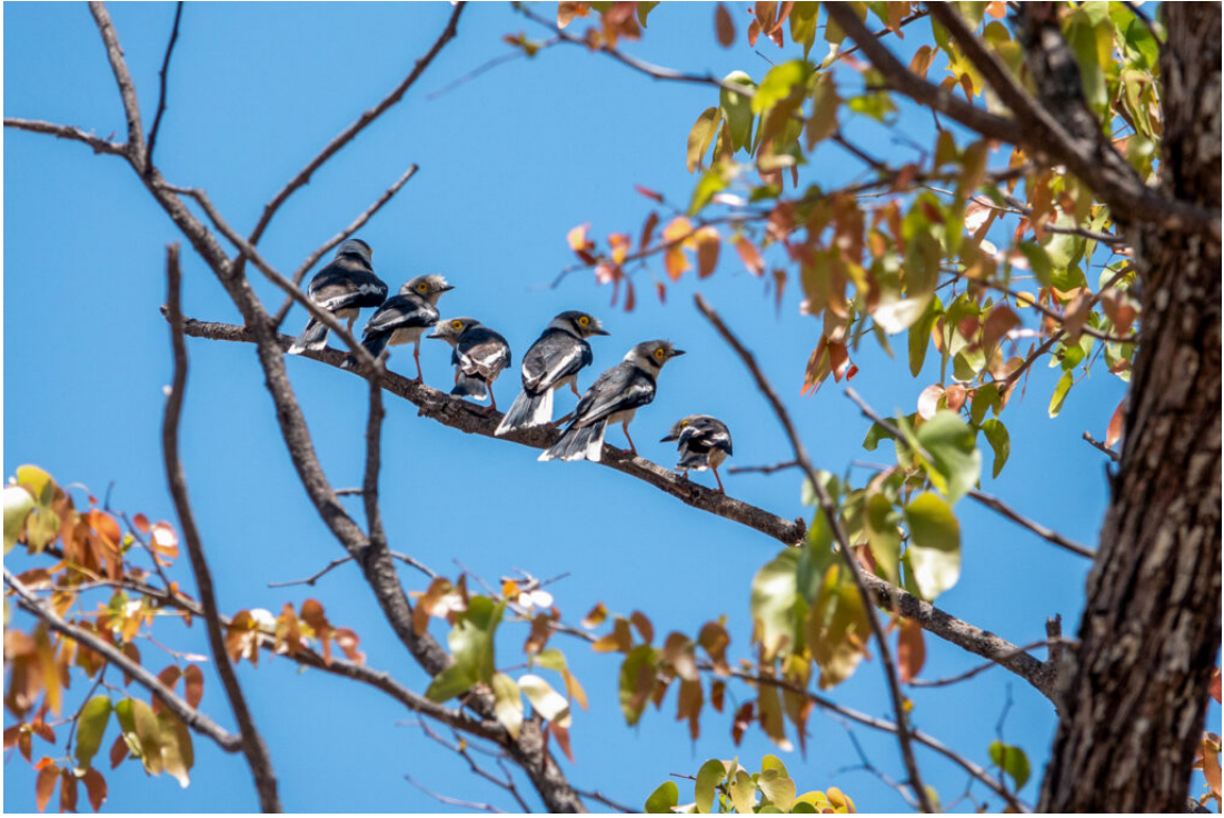
White-crested Helmetshrike