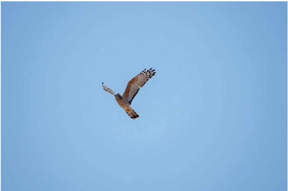
African Cuckoo-Hawk