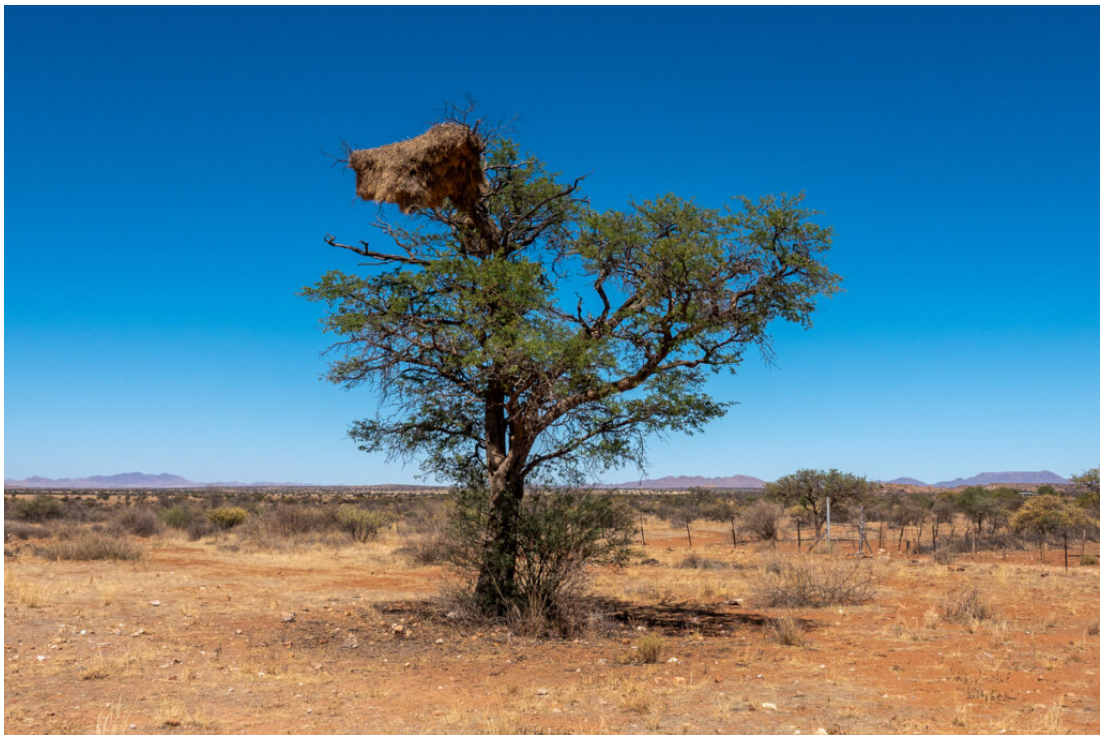
Social Weaver nest in the Namib