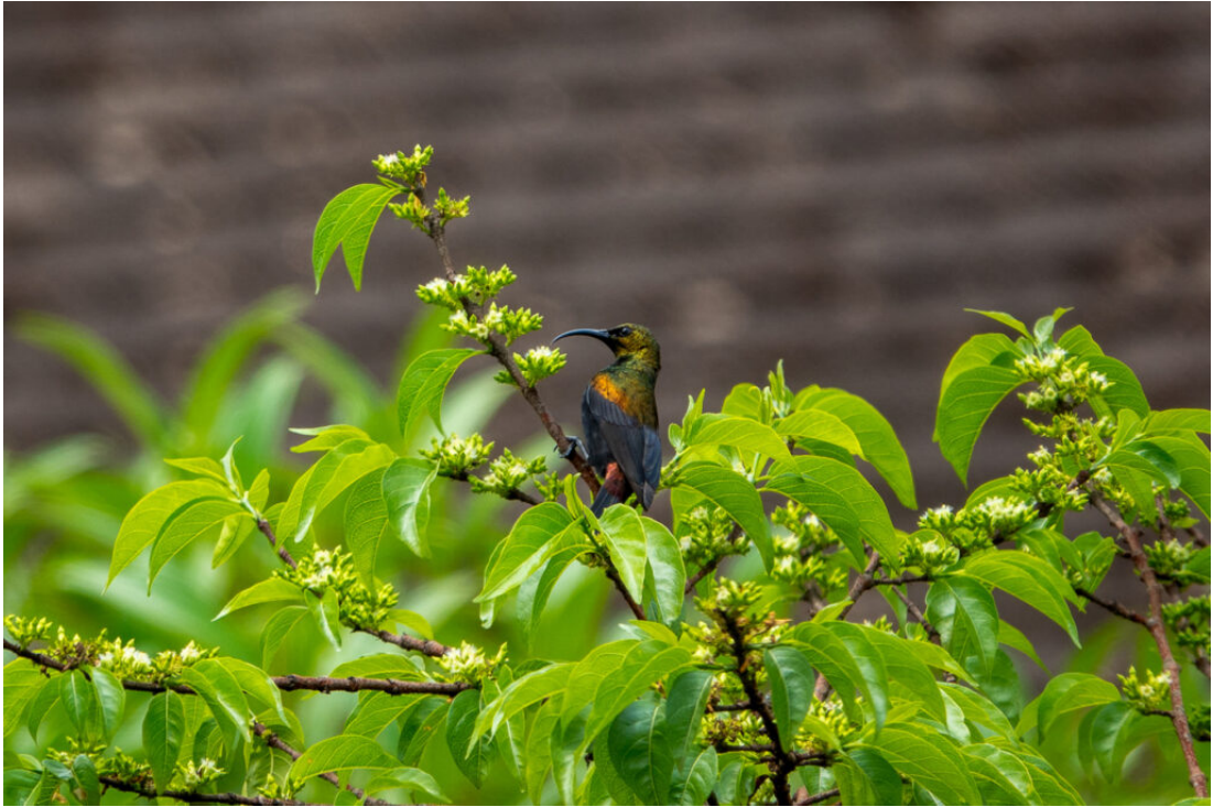
Bronzy Sunbird