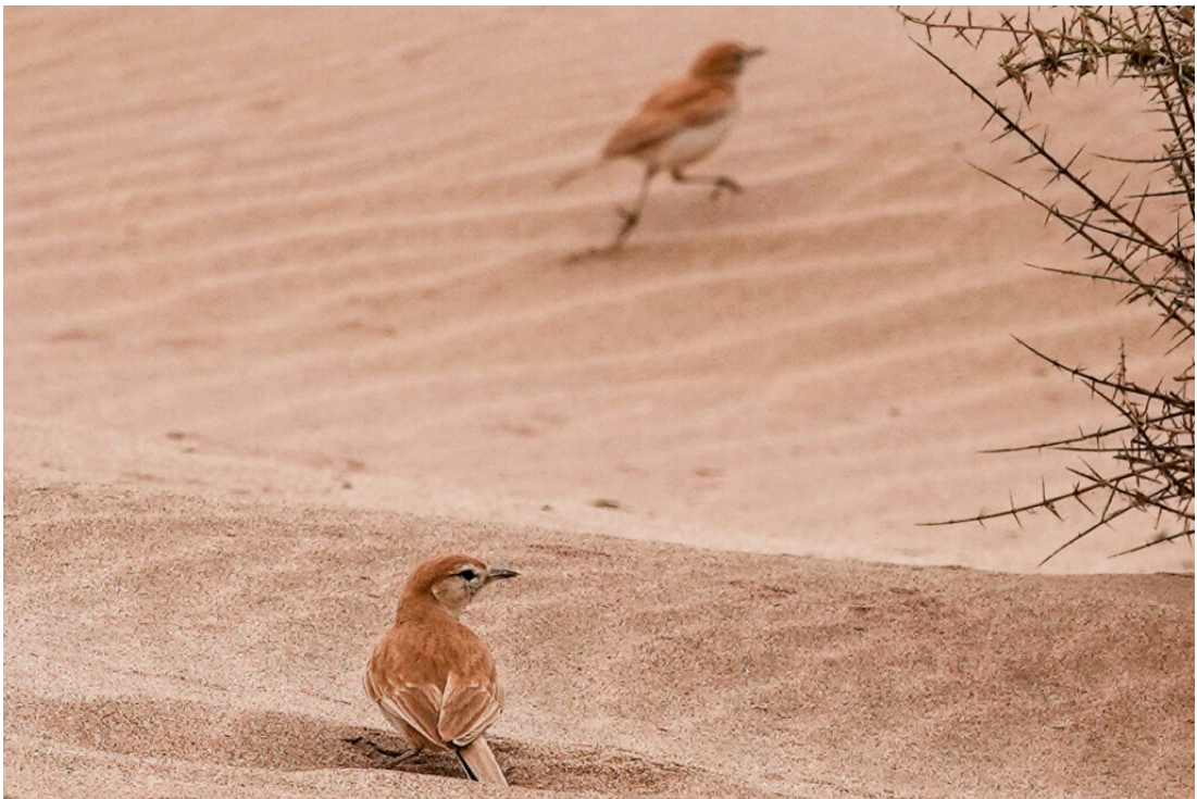
Dune Larks