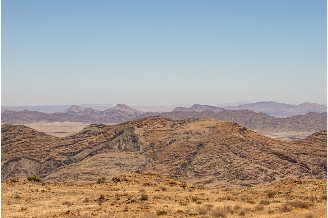
The Namib at Spreetshoogte Pass