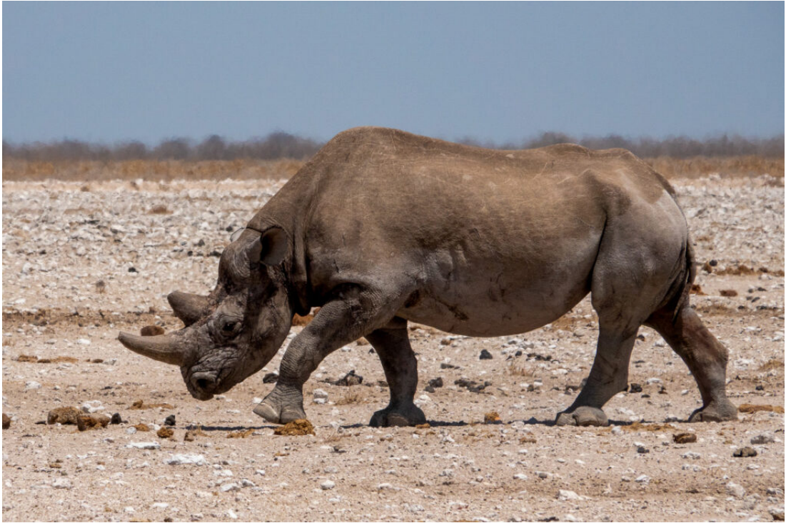
Black Rhino