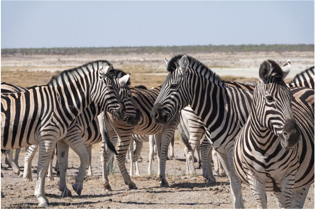
Plains Zebra