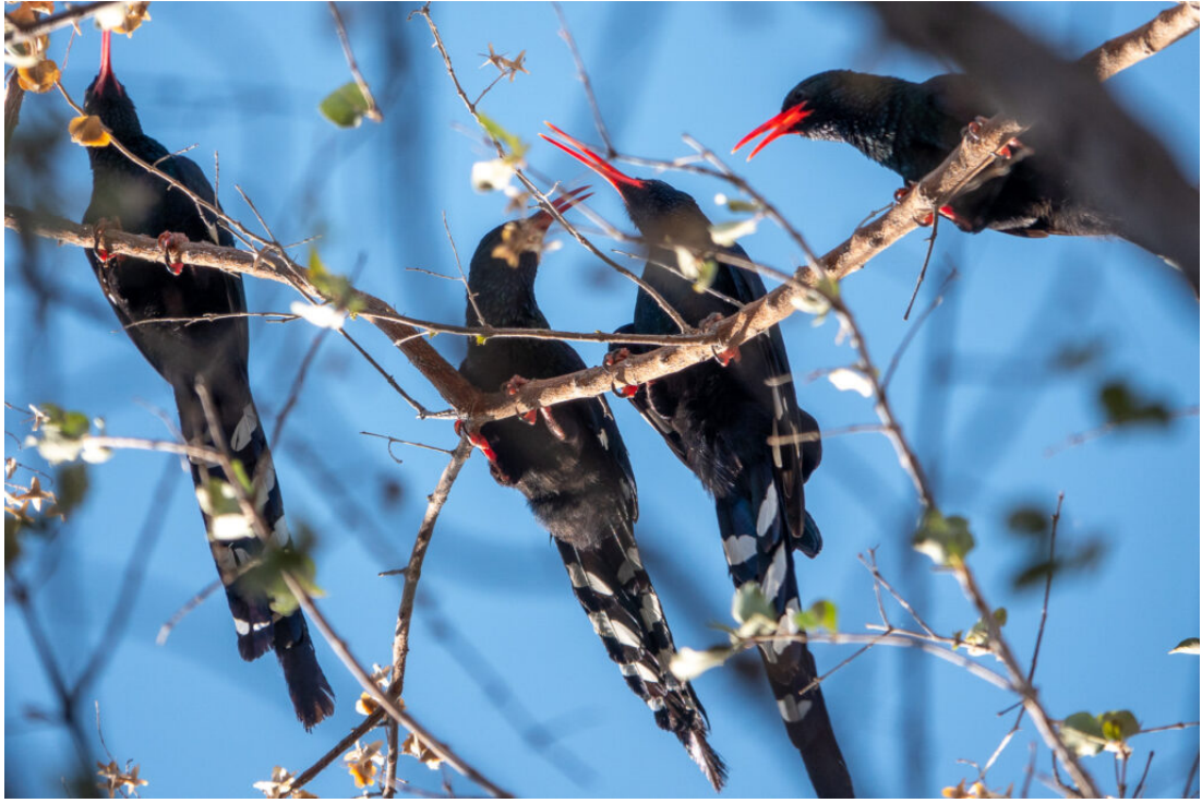
Violet Wood Hoopoes