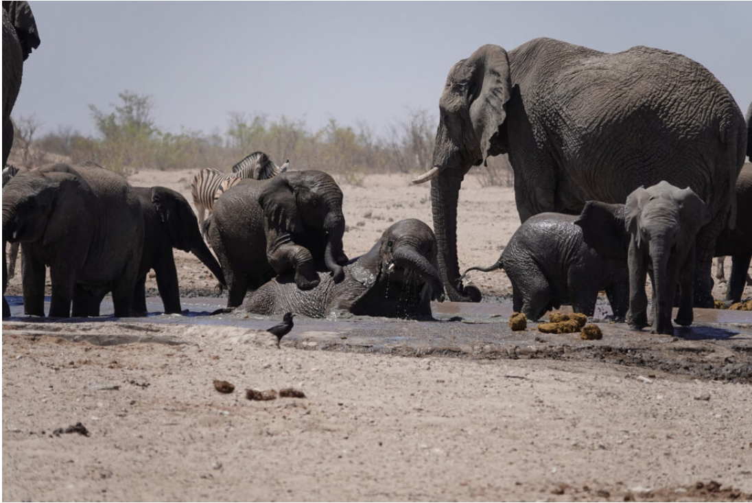
Elephants in Etosha