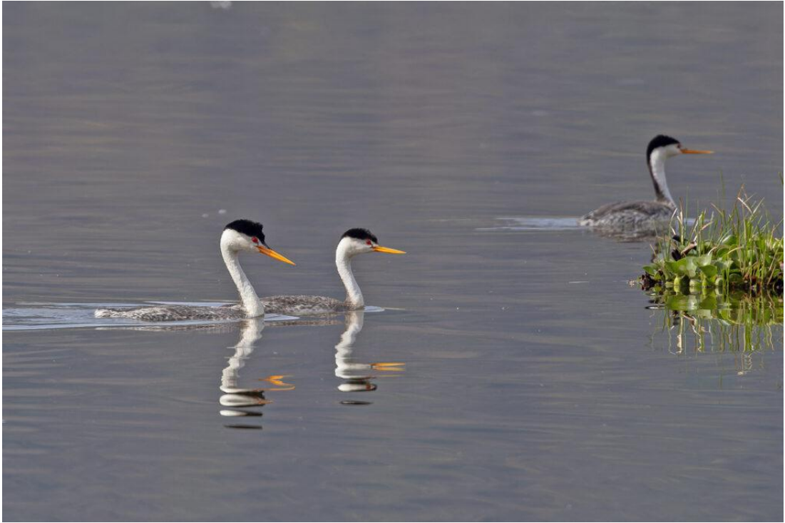
Clark's Grebe