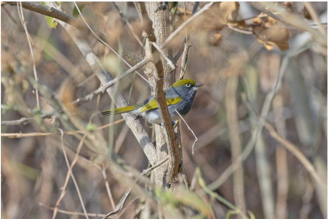
Slaty Vireo