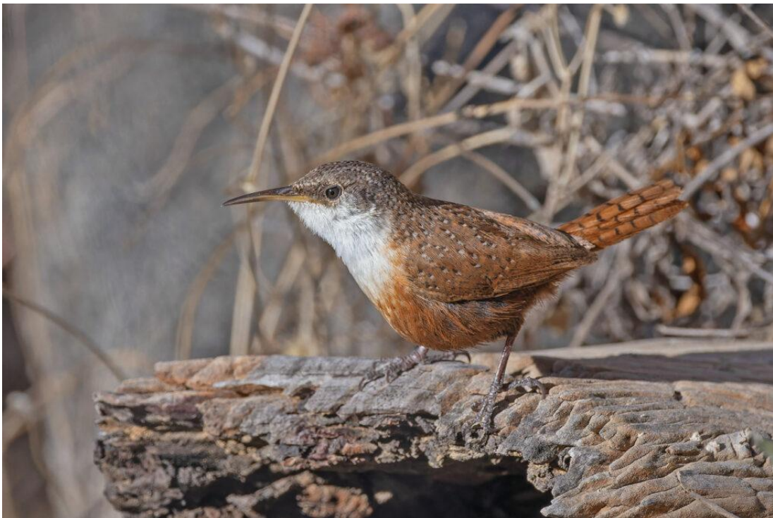
Canyon Wren