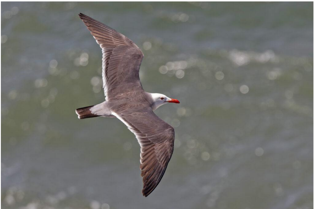
Heermann's Gull