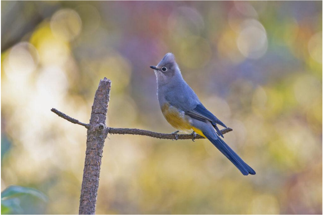
Grey Silky-Flycatcher