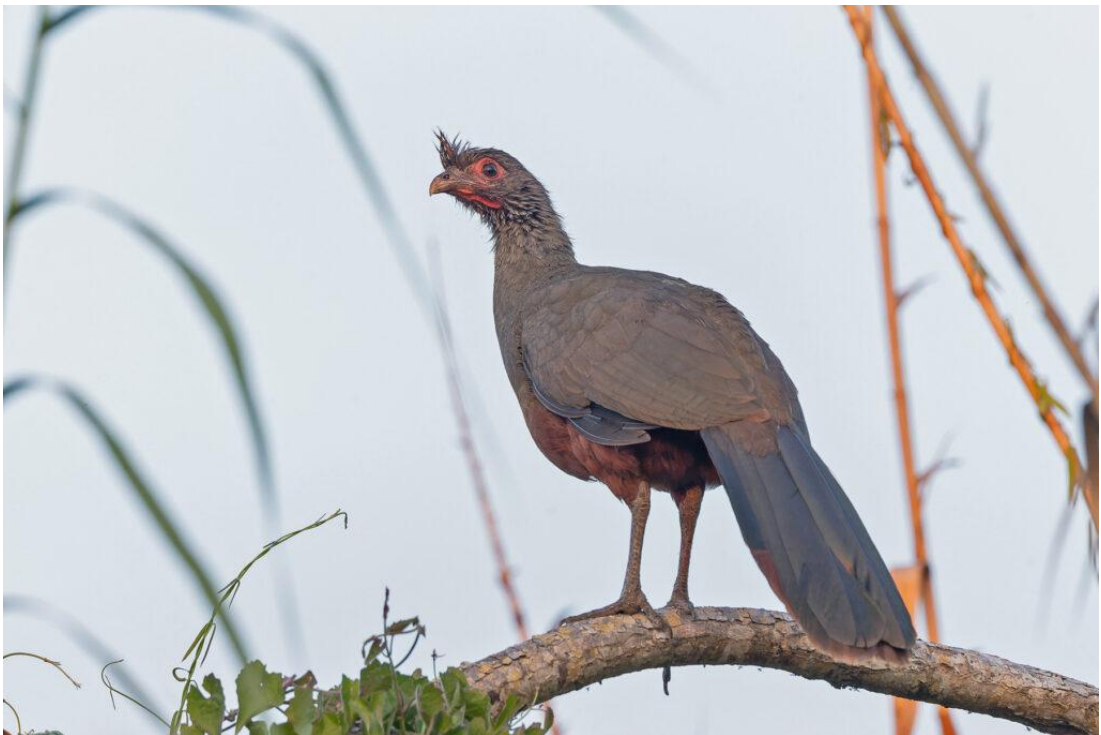
Rufous-bellied Chachalaca