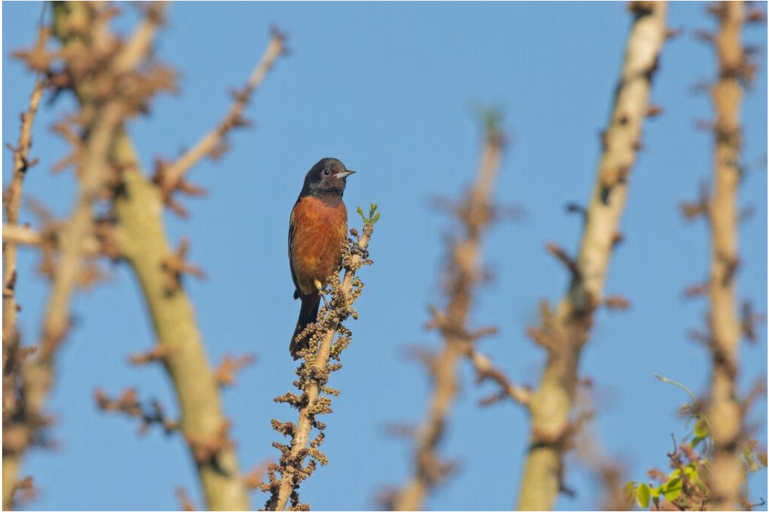
Orchard Oriole