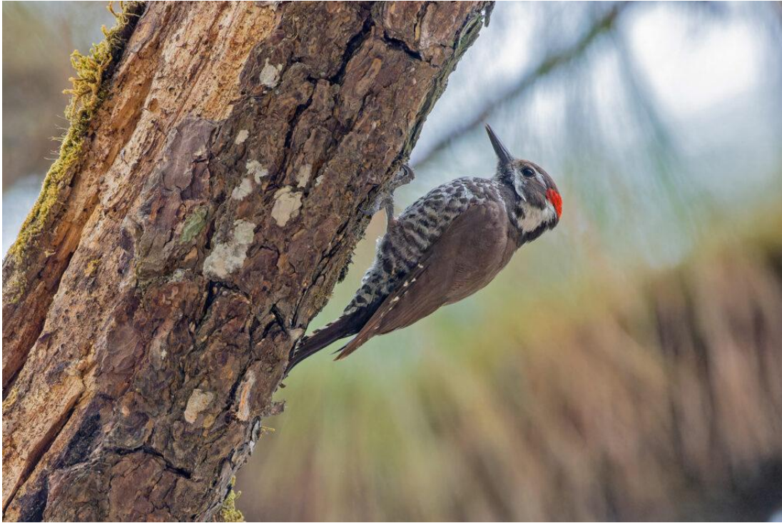
Arizona Woodpecker