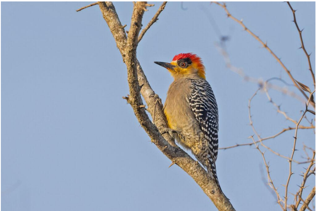
Golden-cheeked Woodpecker