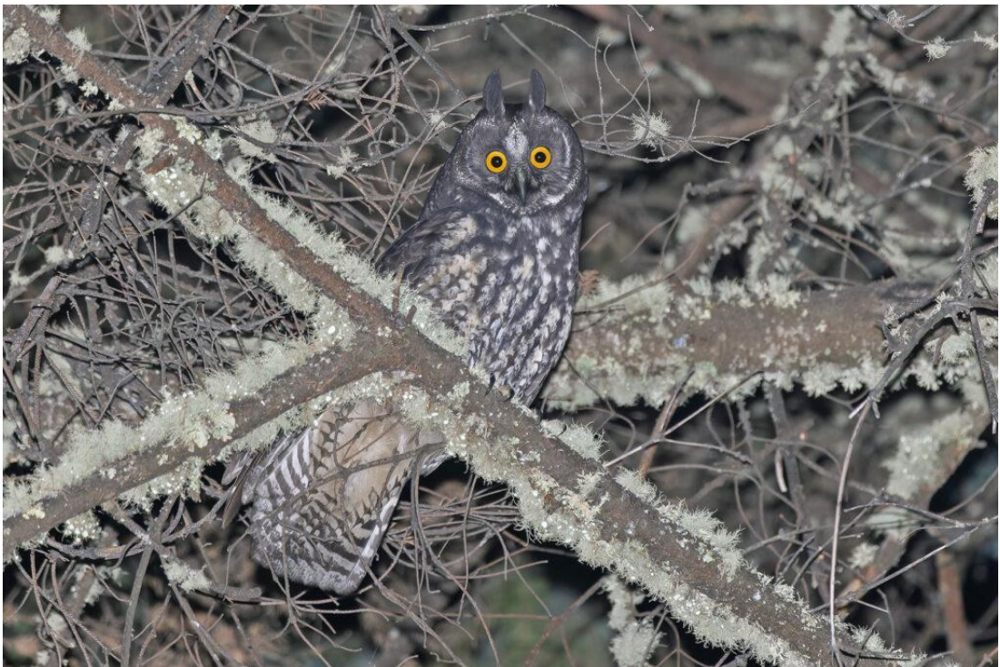
Stygian Owl