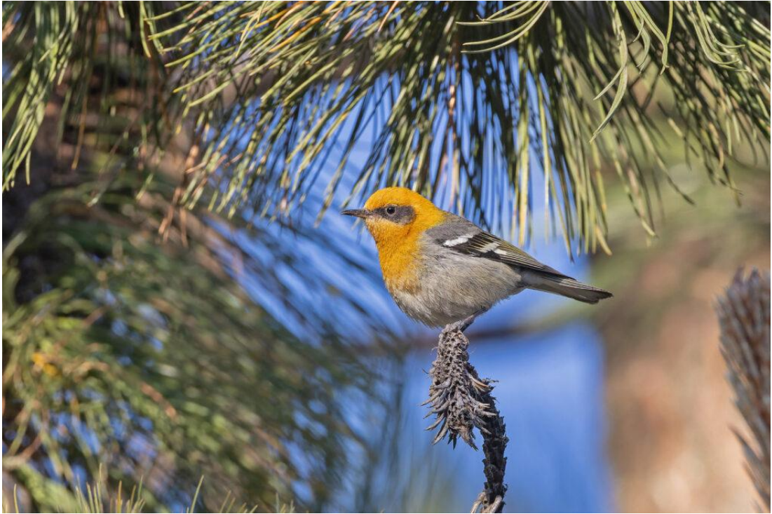
Olive Warbler