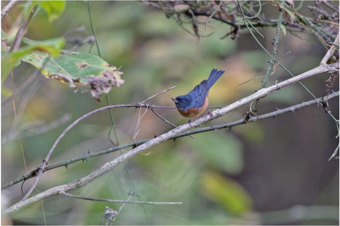
Cinnamon-bellied Flowerpiercer