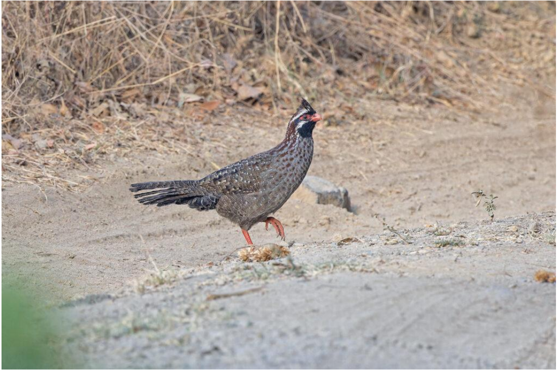
Long-tailed Wood Partridge