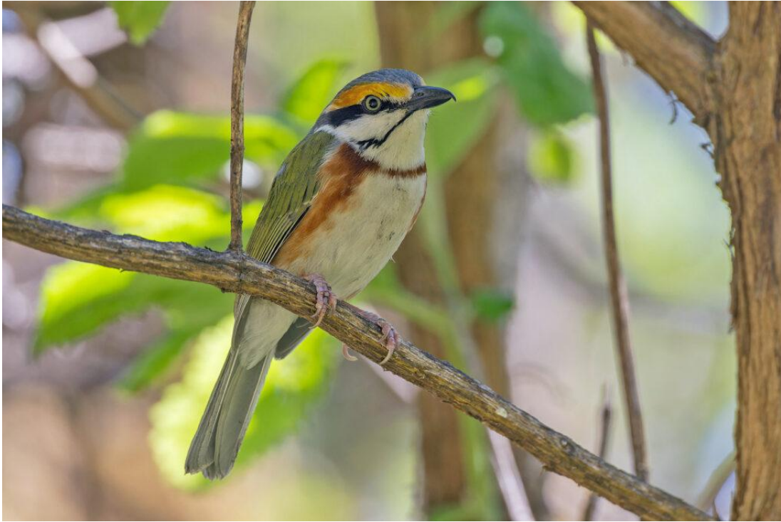
Chestnut-sided Shrike-Vireo