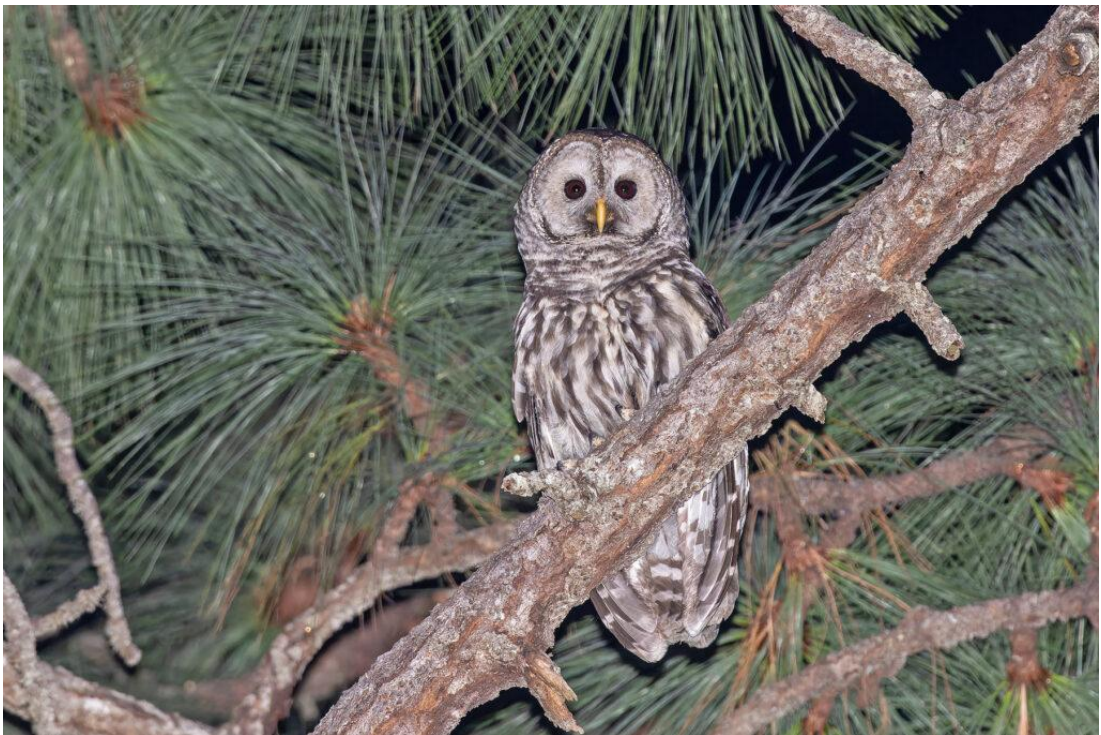
Cinereous Owl