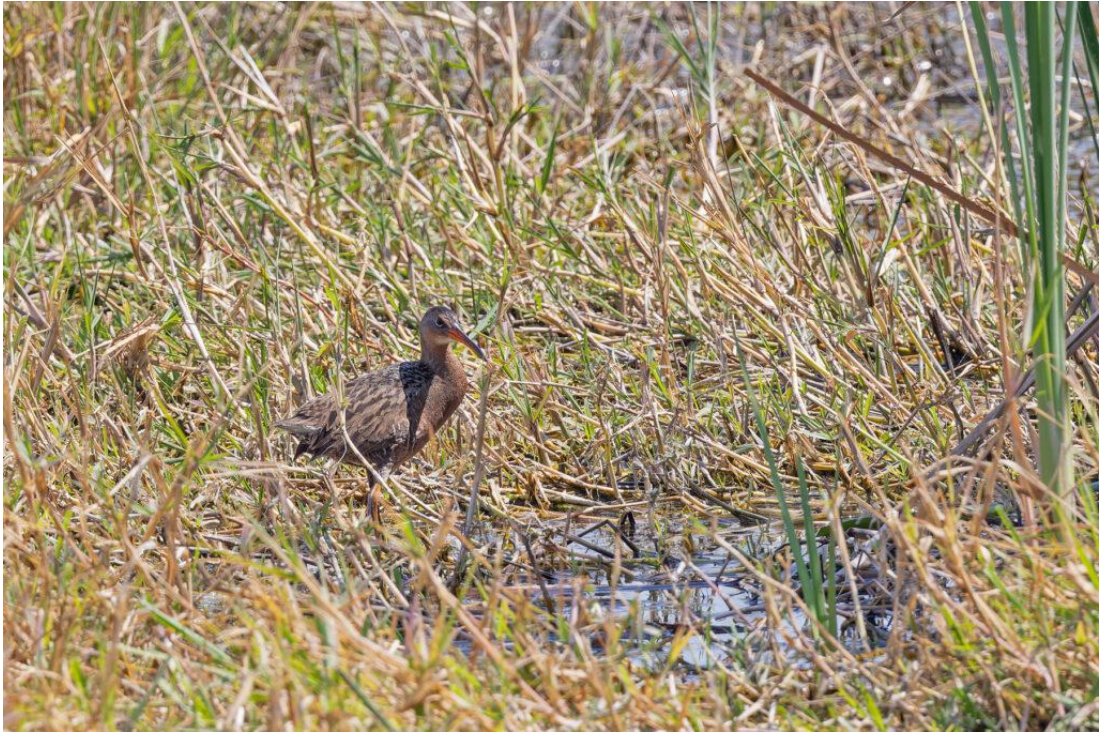
Aztec Rail