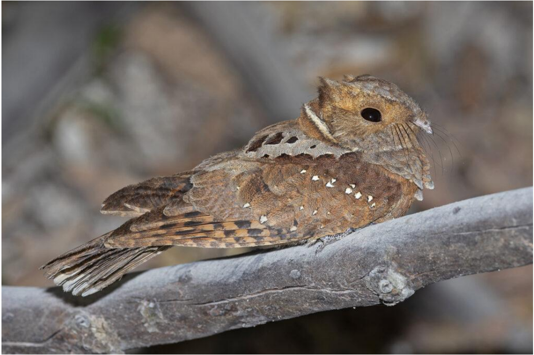
Eared Poorwill