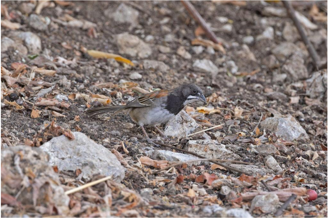
Black-chested Sparrow