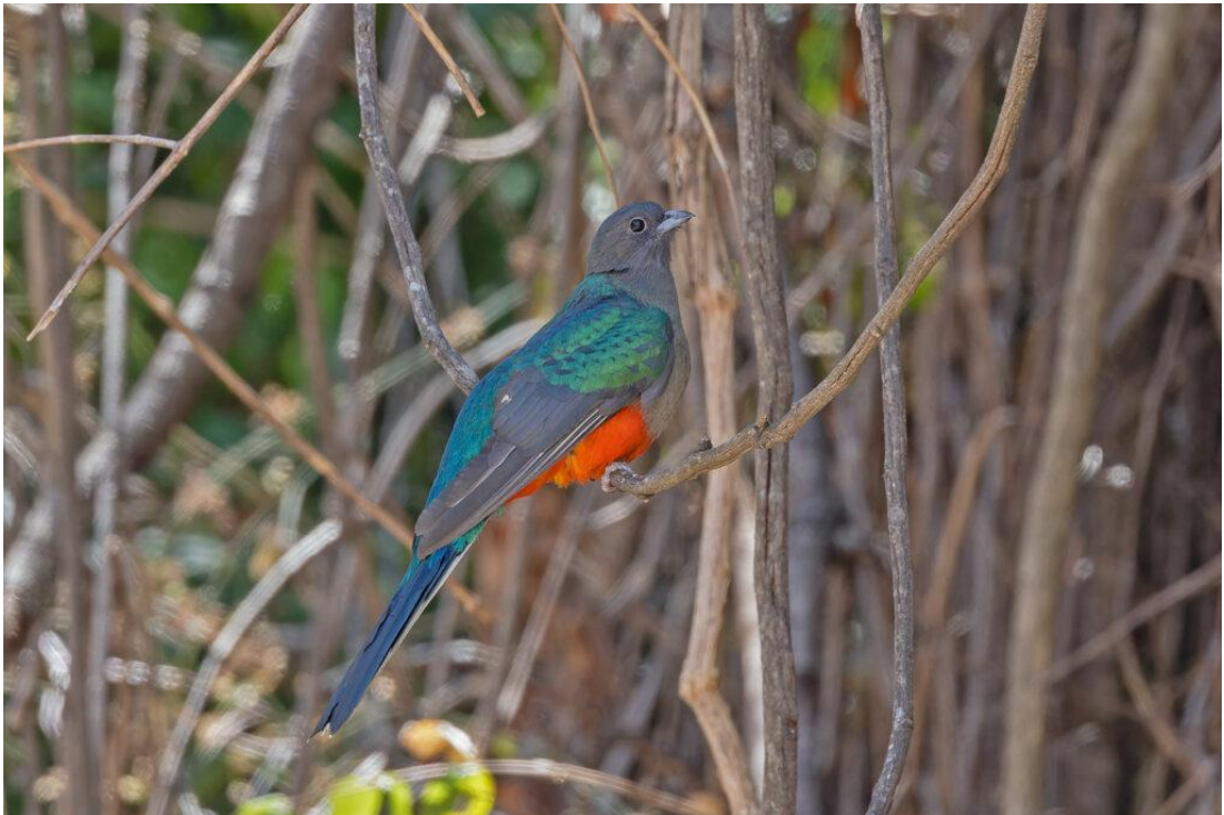
Eared Quetzal