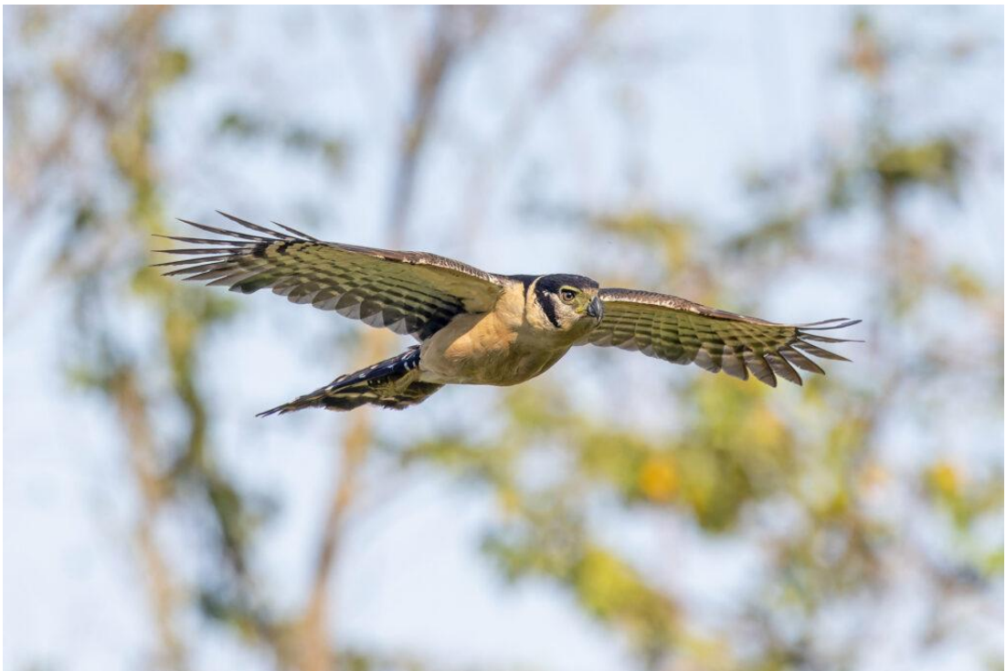
Collared Forest Falcon