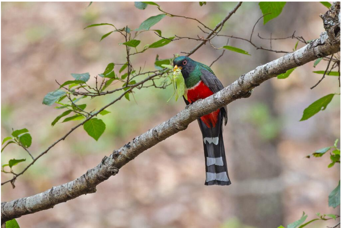
Mountain Trogon