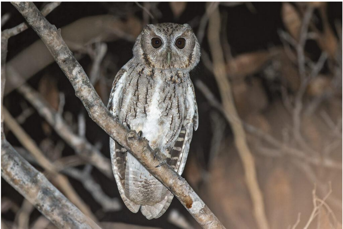
Balsas Screech Owl