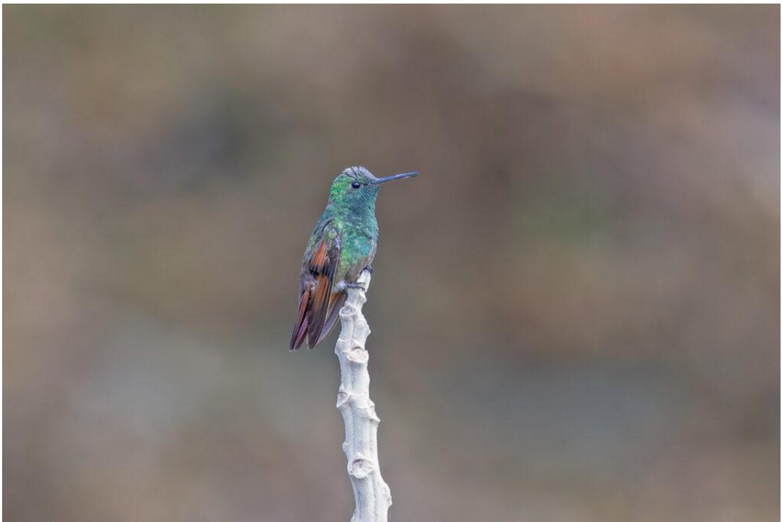
Berylline Hummingbird