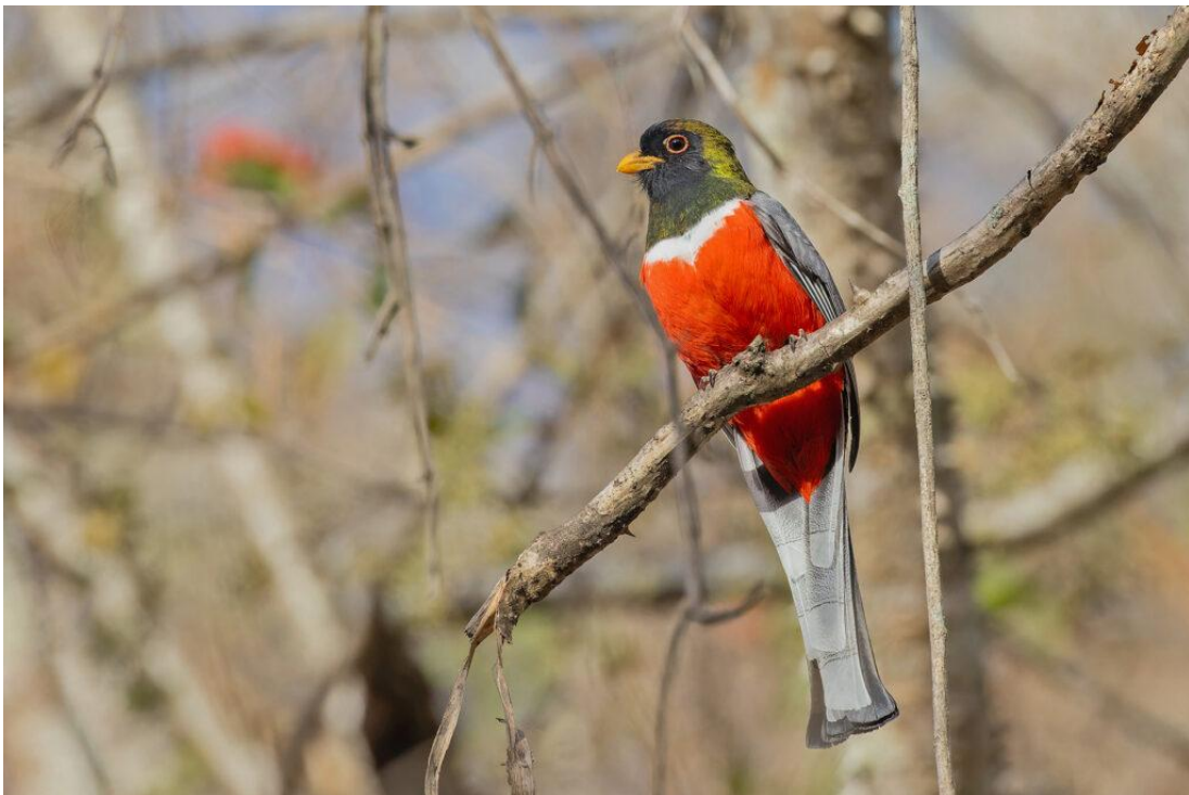
Elegant Trogon