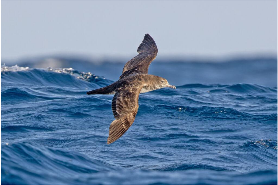
Pink-footed Shearwater