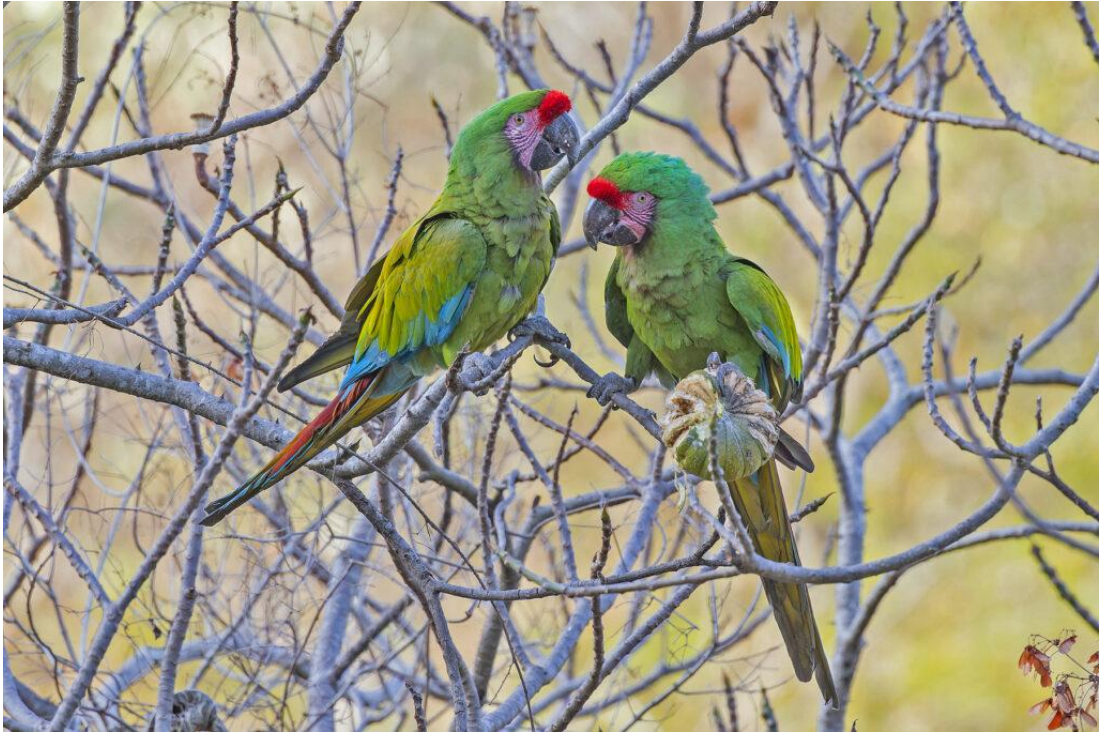
Military Macaw