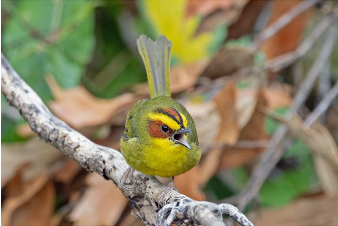
Golden-browed Warbler