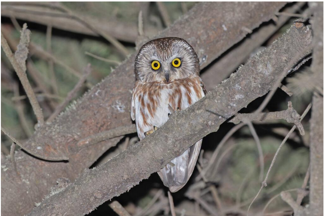
Northern Saw-whet Owl