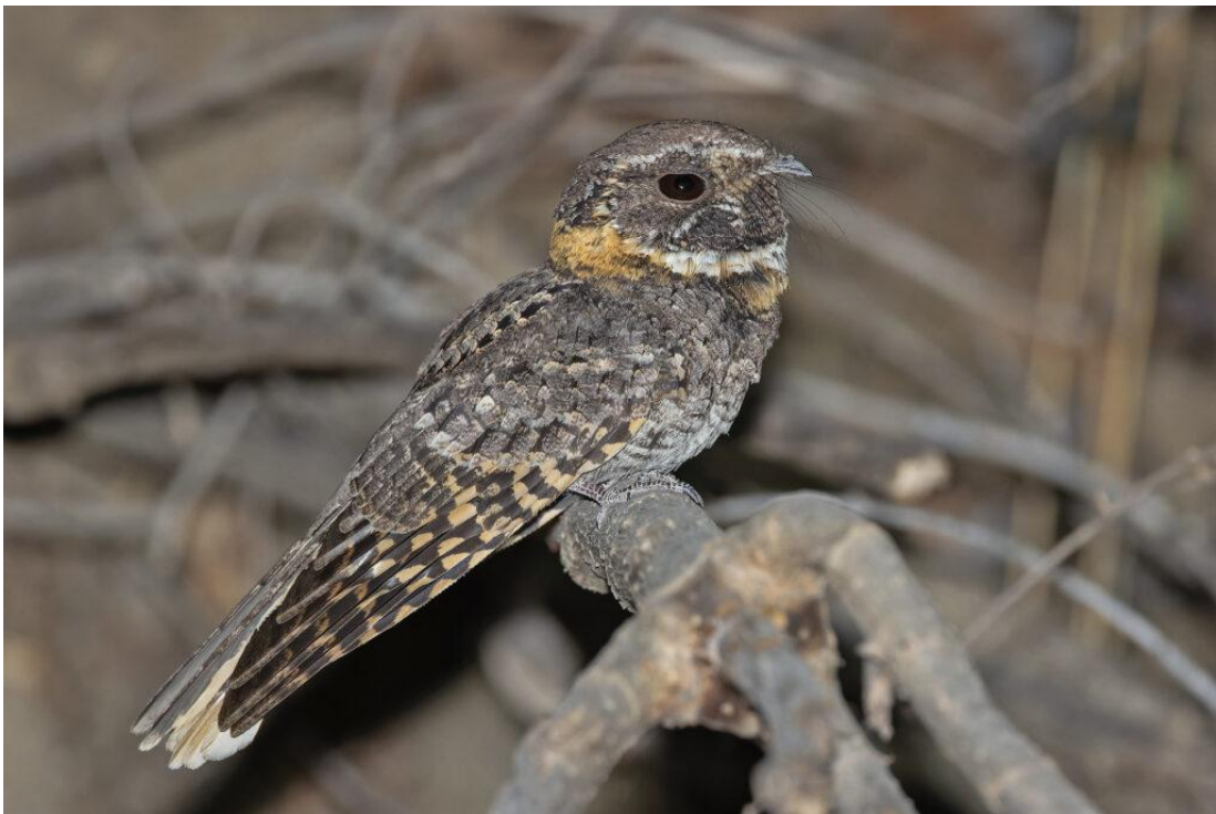
Buff-collared Nightjar