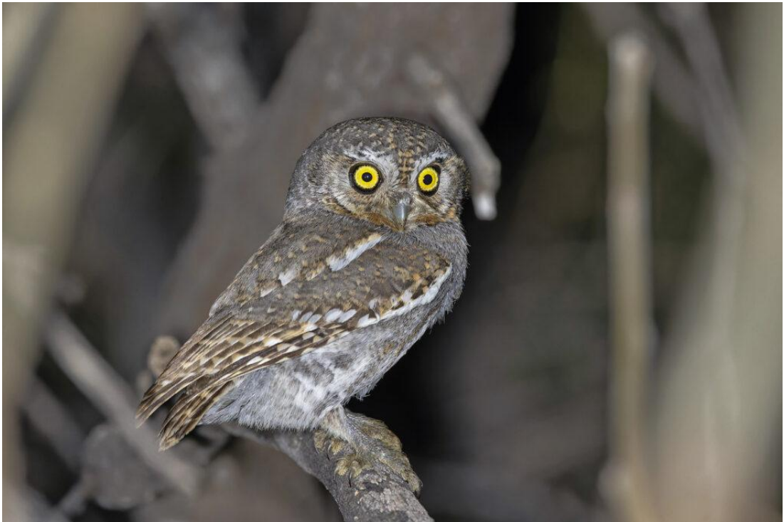
Elf Owl