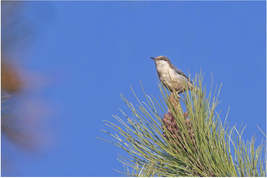
Pygmy Nuthatch