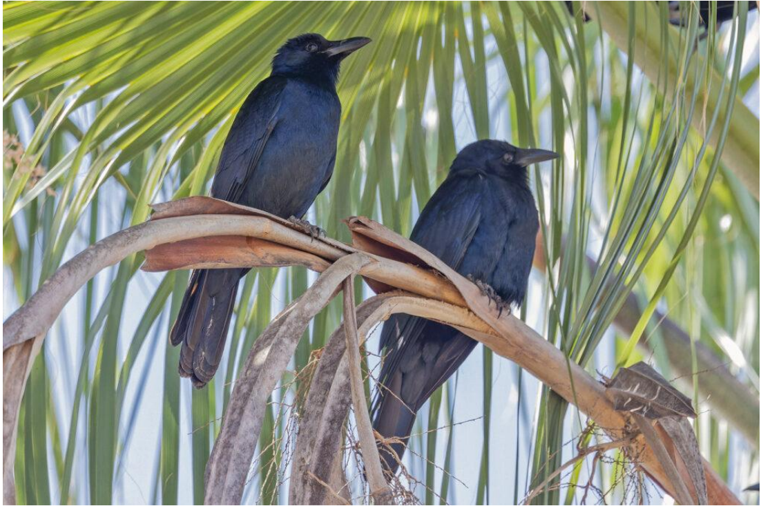
Sinaloa Crow