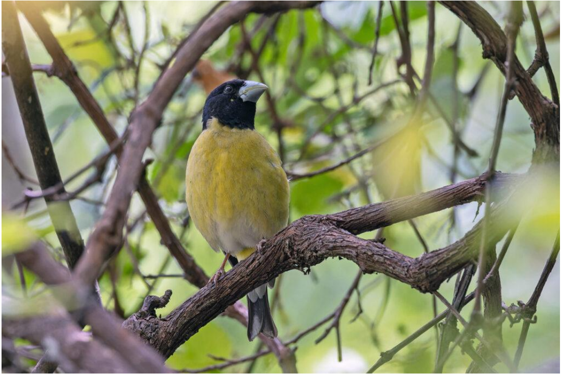
Hooded Grosbeak