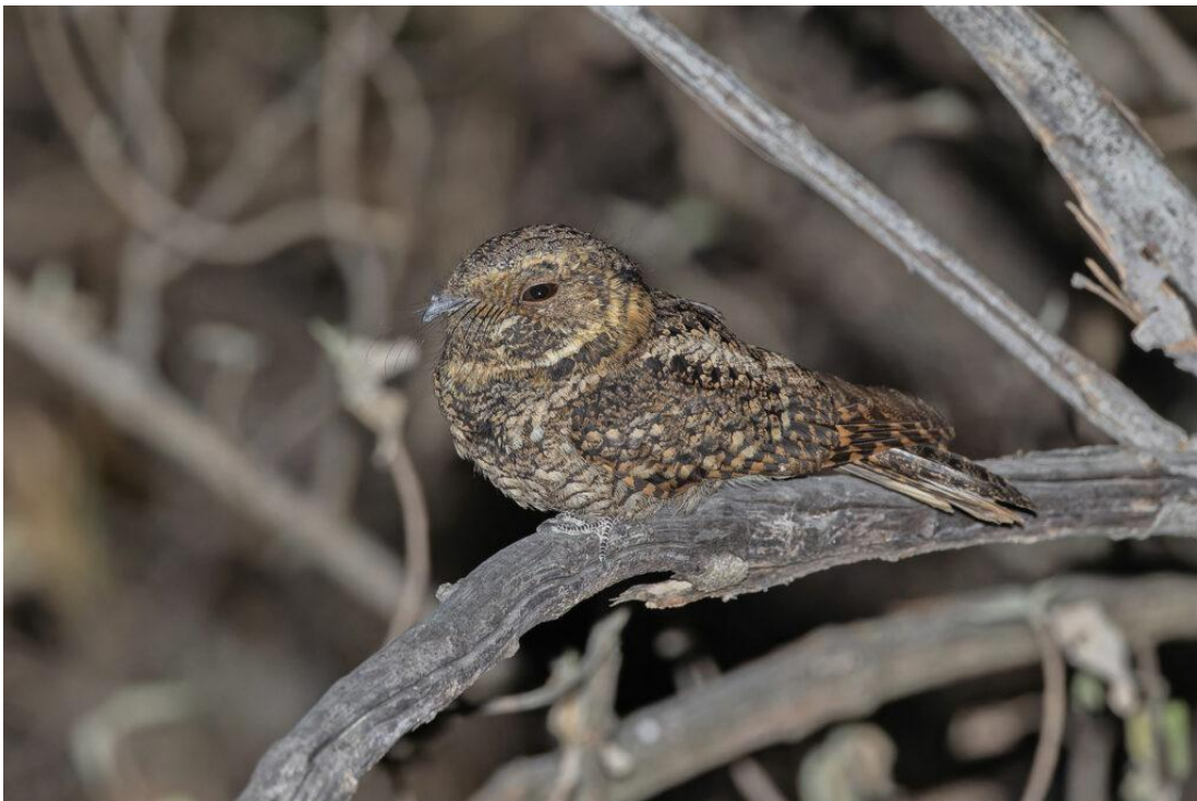
Mexican Whip-poor-will