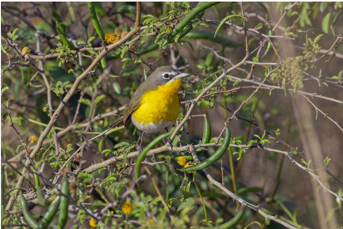
Yellow-breasted Chat