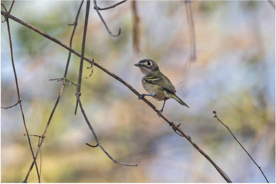
Black-capped Vireo