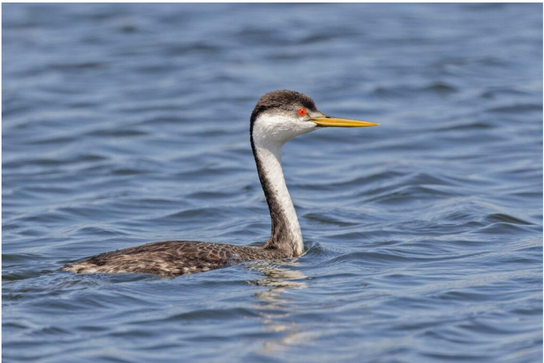
Western Grebe