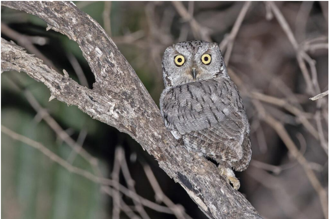
Western Screech Owl