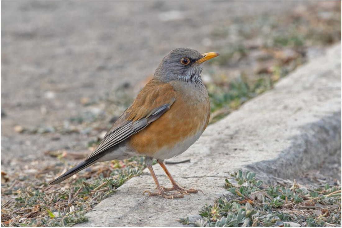
Rufous-backed Thrush