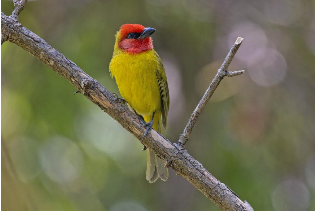
Red-headed Tanager