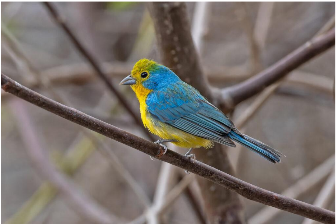
Orange-breasted Bunting