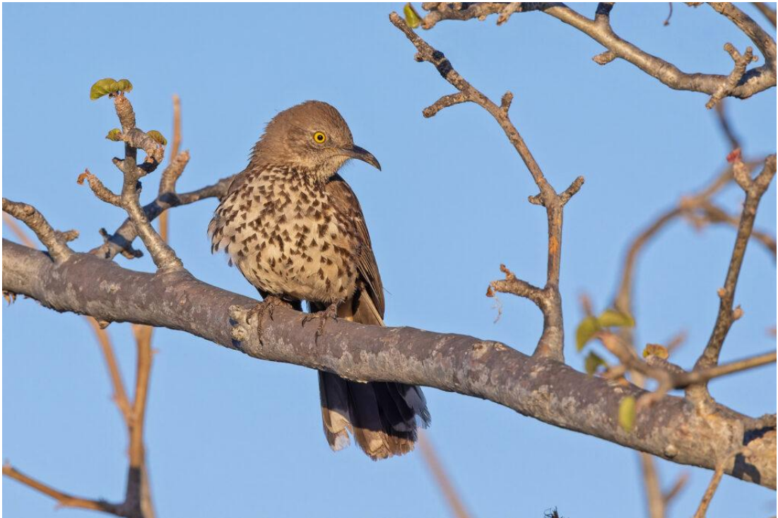
Grey Thrasher