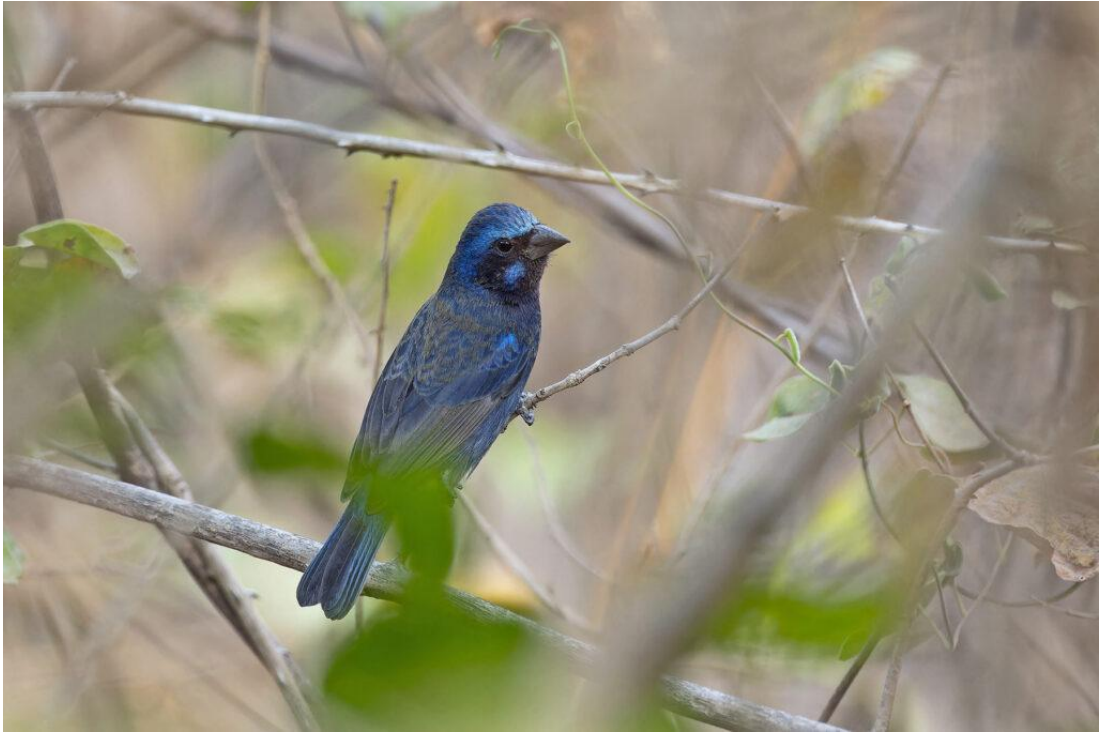
Blue Bunting