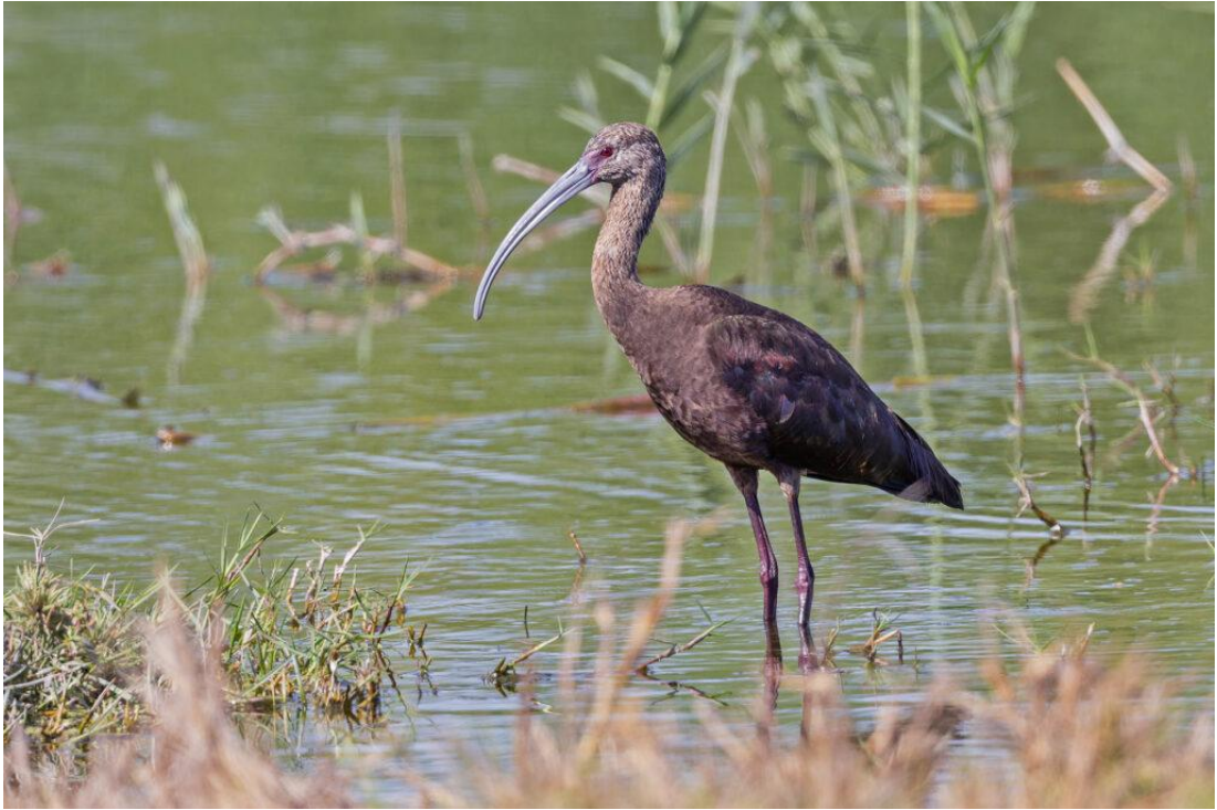
White-faced Ibis