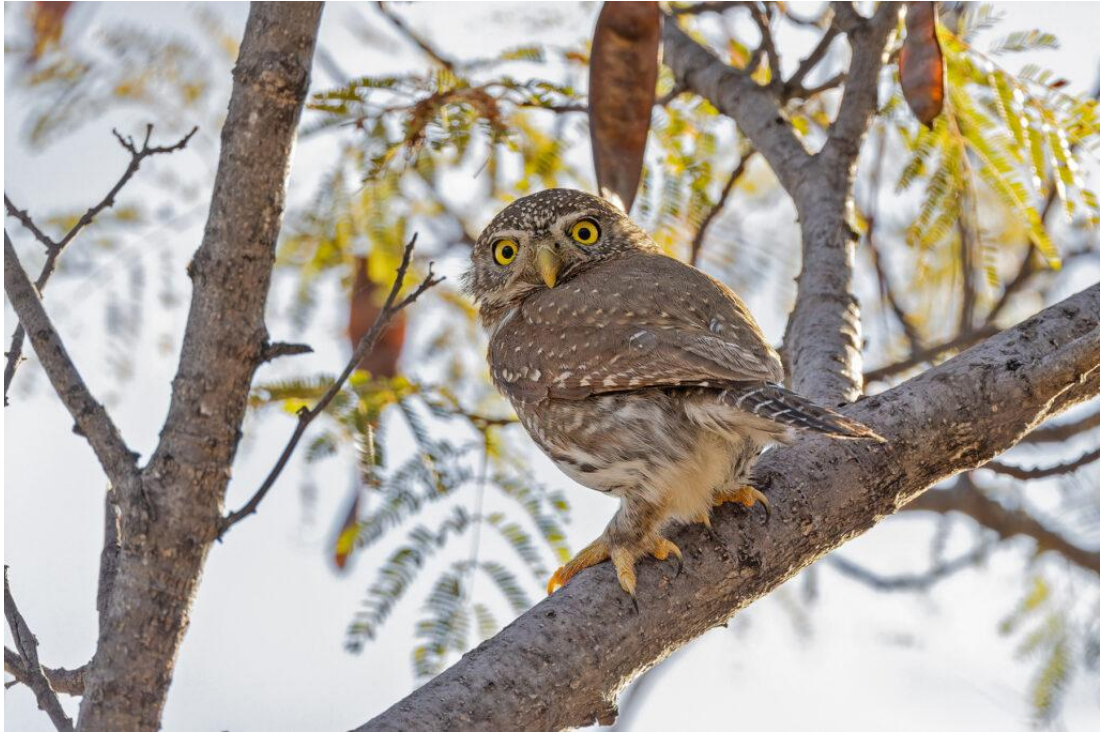
Baja Pygmy Owl