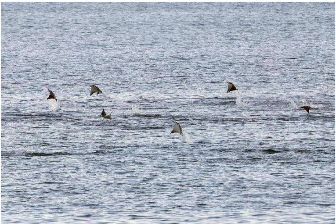
Mobula Ray