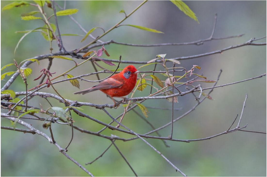
Red Warbler