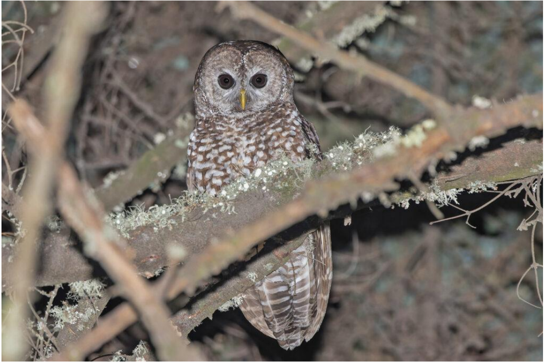
Spotted Owl