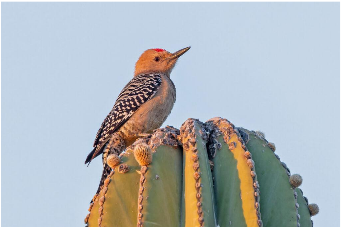
Gila Woodpecker