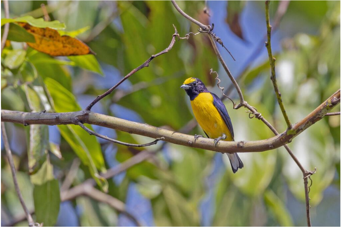
West Mexican Euphonia