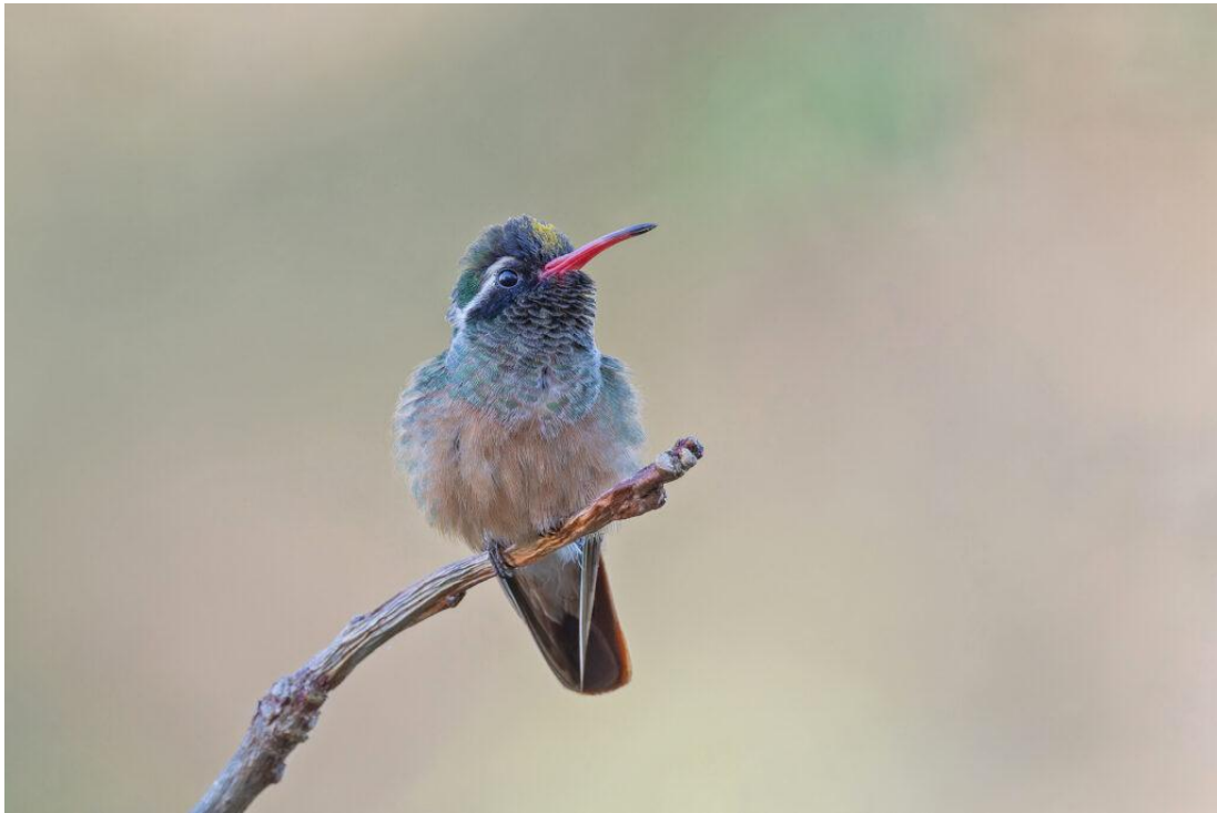
Xantus's Hummingbird