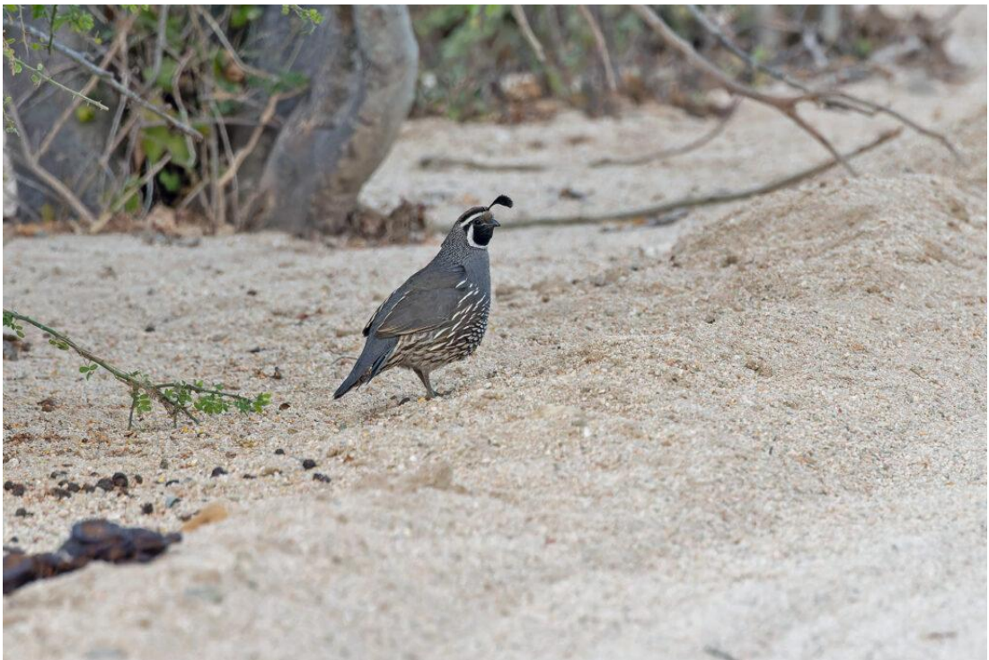
California Quail