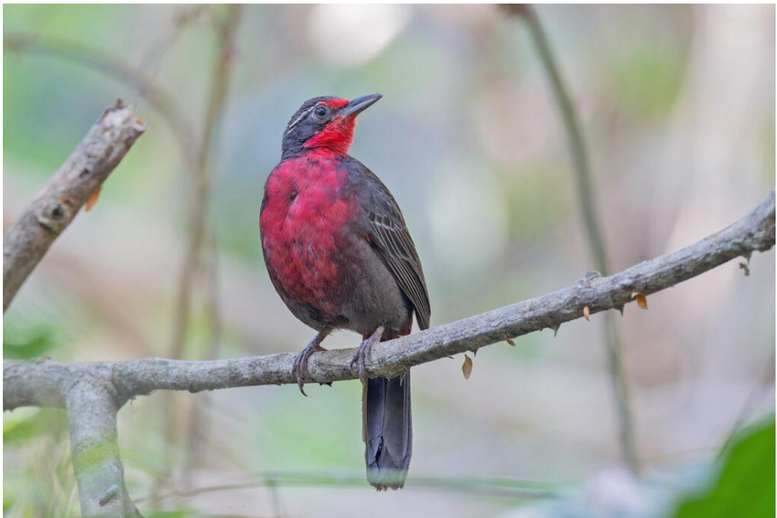
Rosy Thrush-tanager