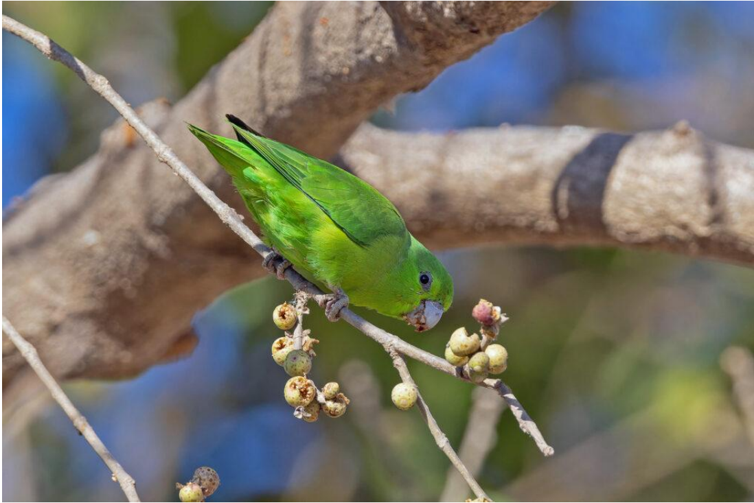
Mexican Parrotlet