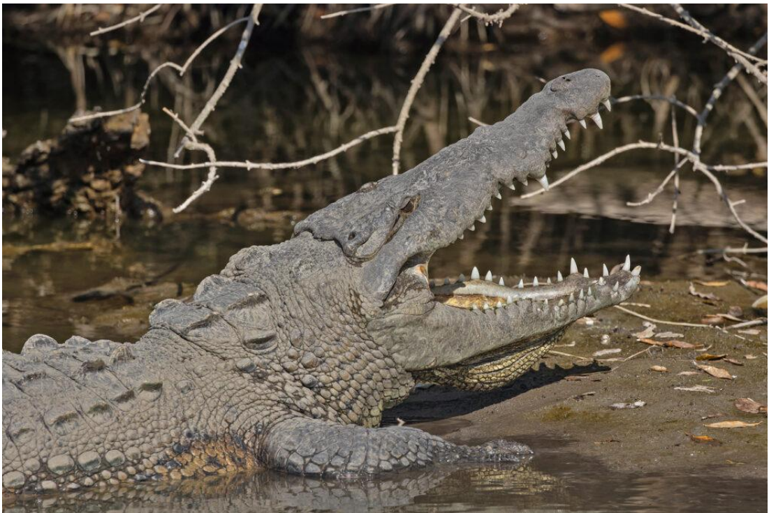
American Crocodile