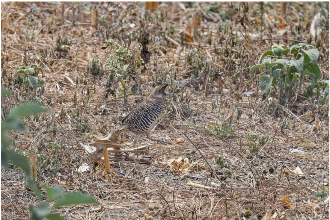
Banded Quail