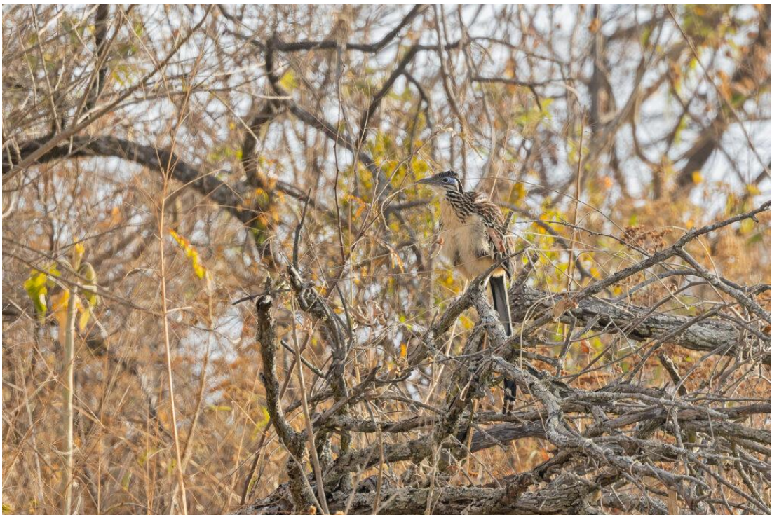
Lesser Roadrunner