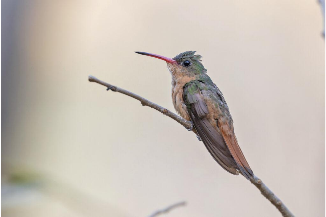
Cinnamon Hummingbird