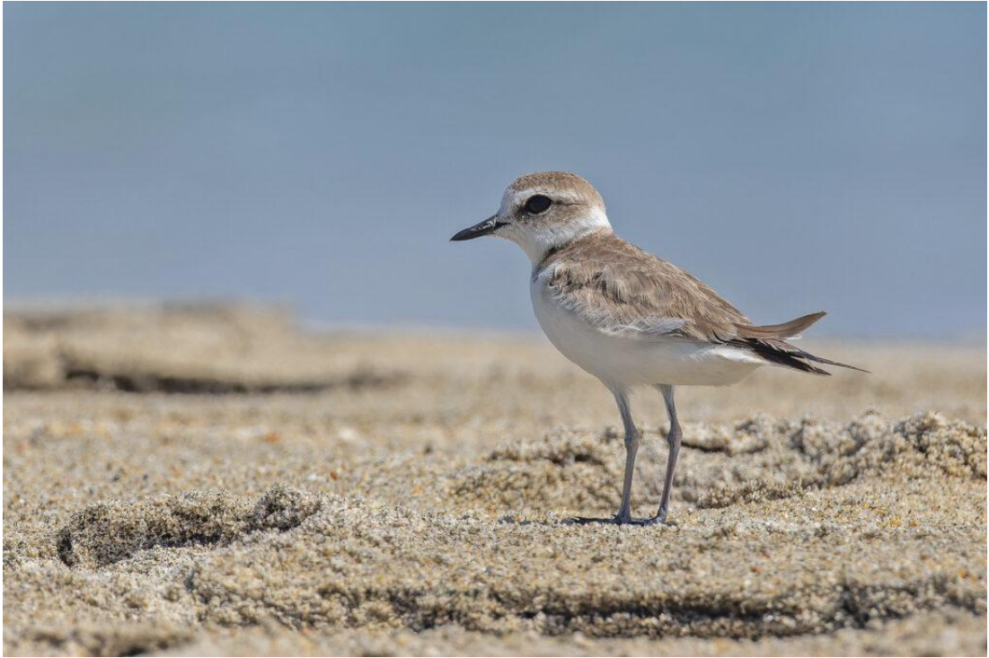
Snowy Plover