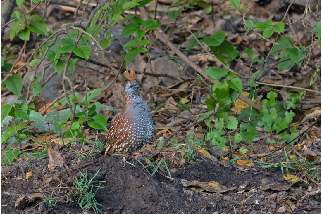
Elegant Quail