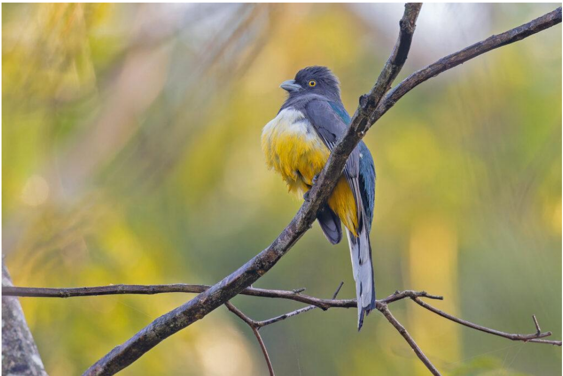
Citreoline Trogon