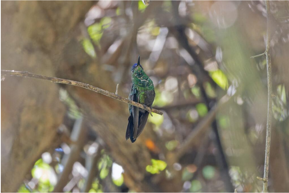
Mexican Woodnymph