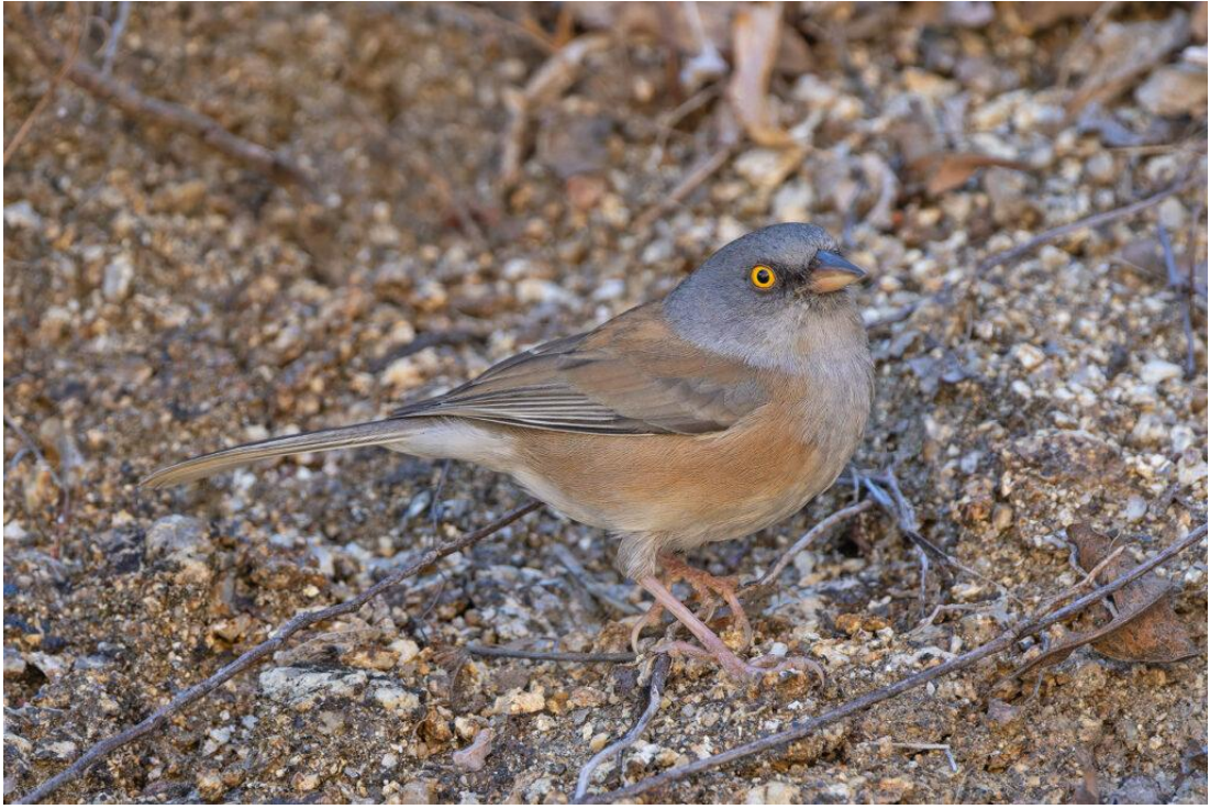
Baird's Junco