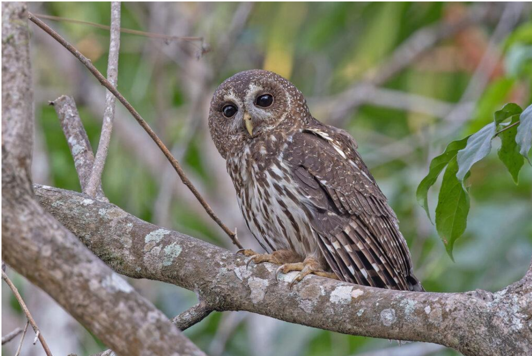
Mottled Owl