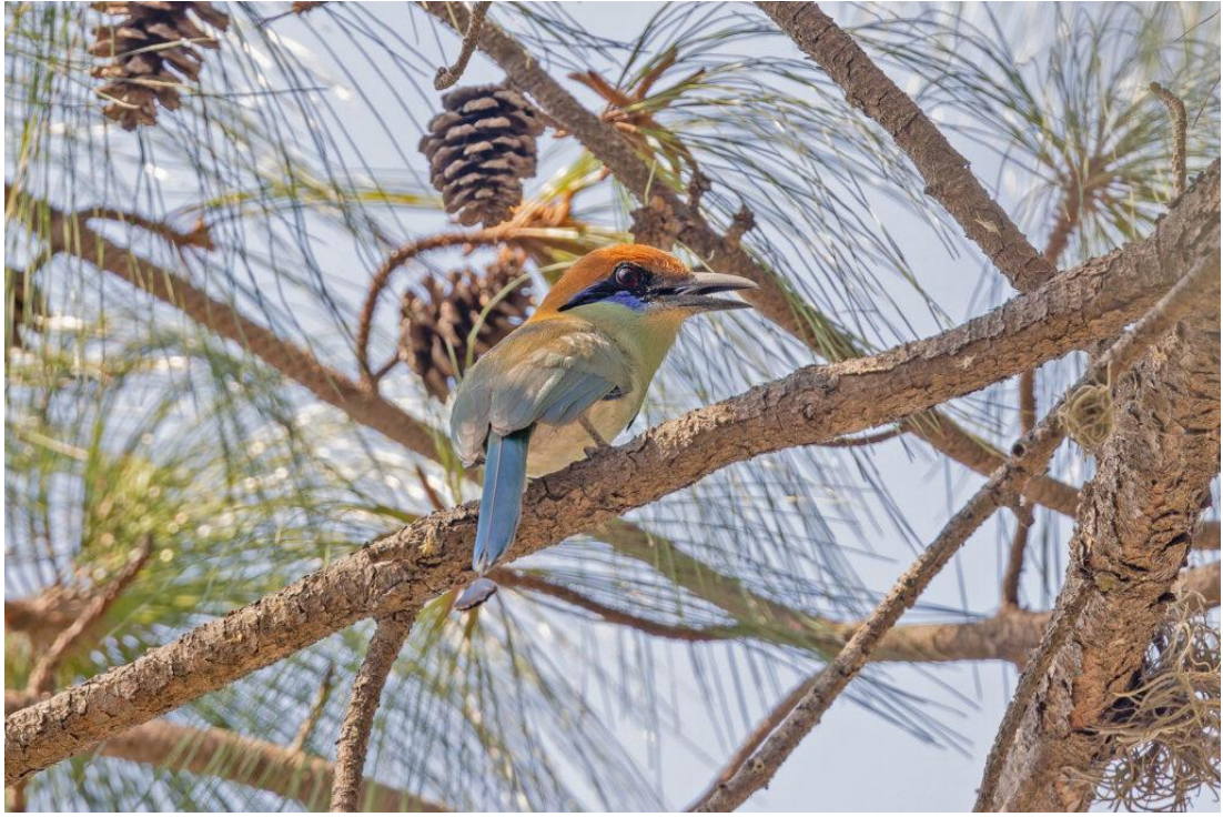
Russet-crowned Motmot