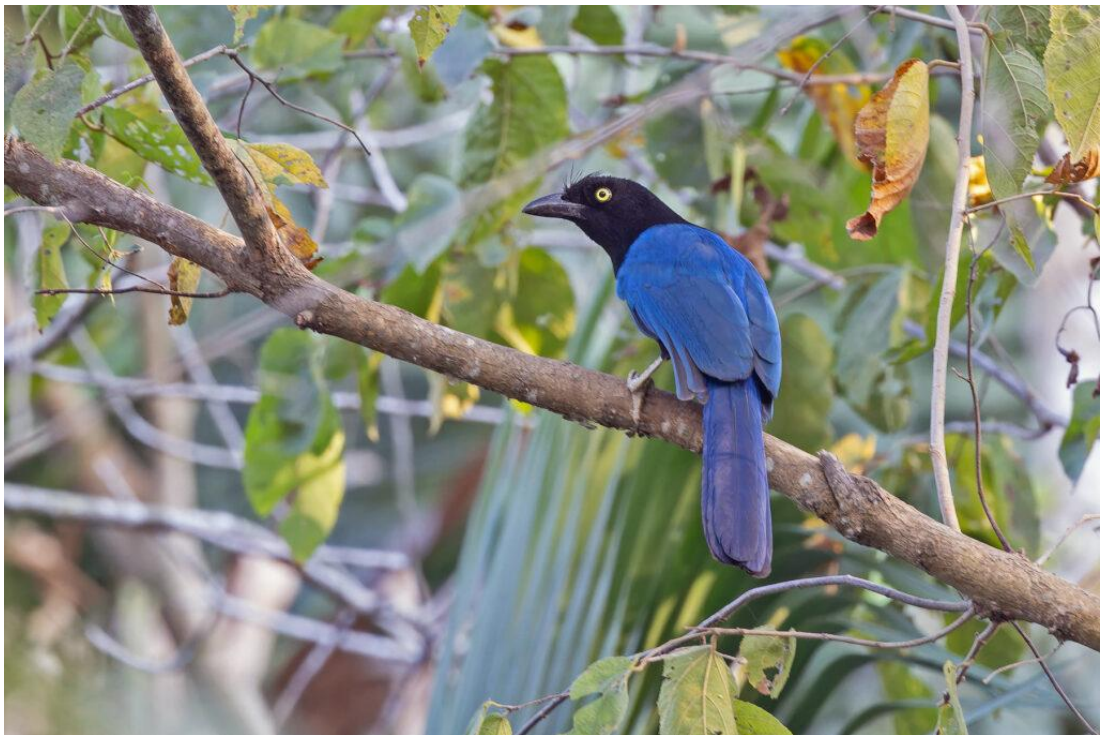
San Blas Jay