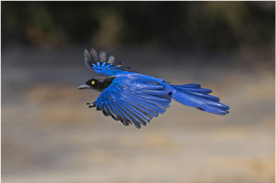
Purplish-backed Jay