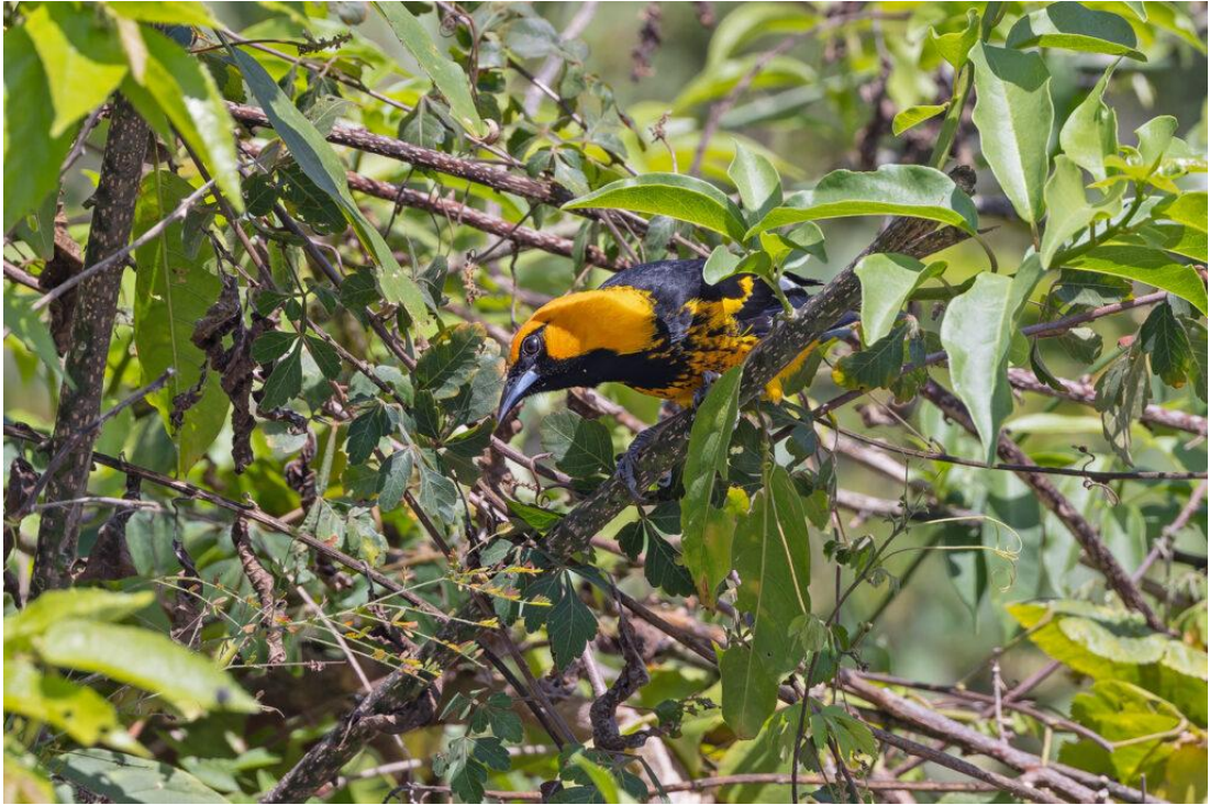
Spot-breasted Oriole