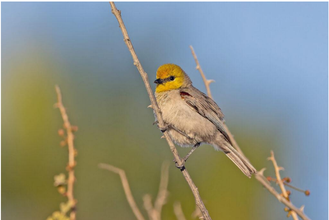
Verdin