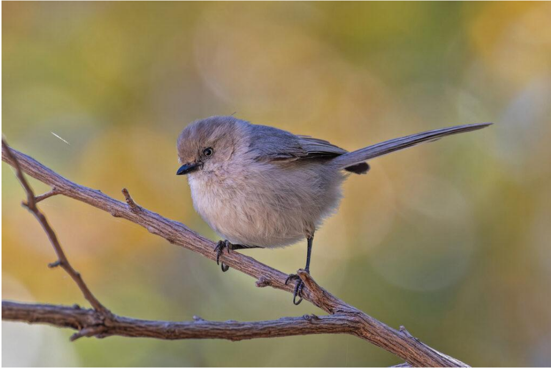
American (Grinda's) Bushtit