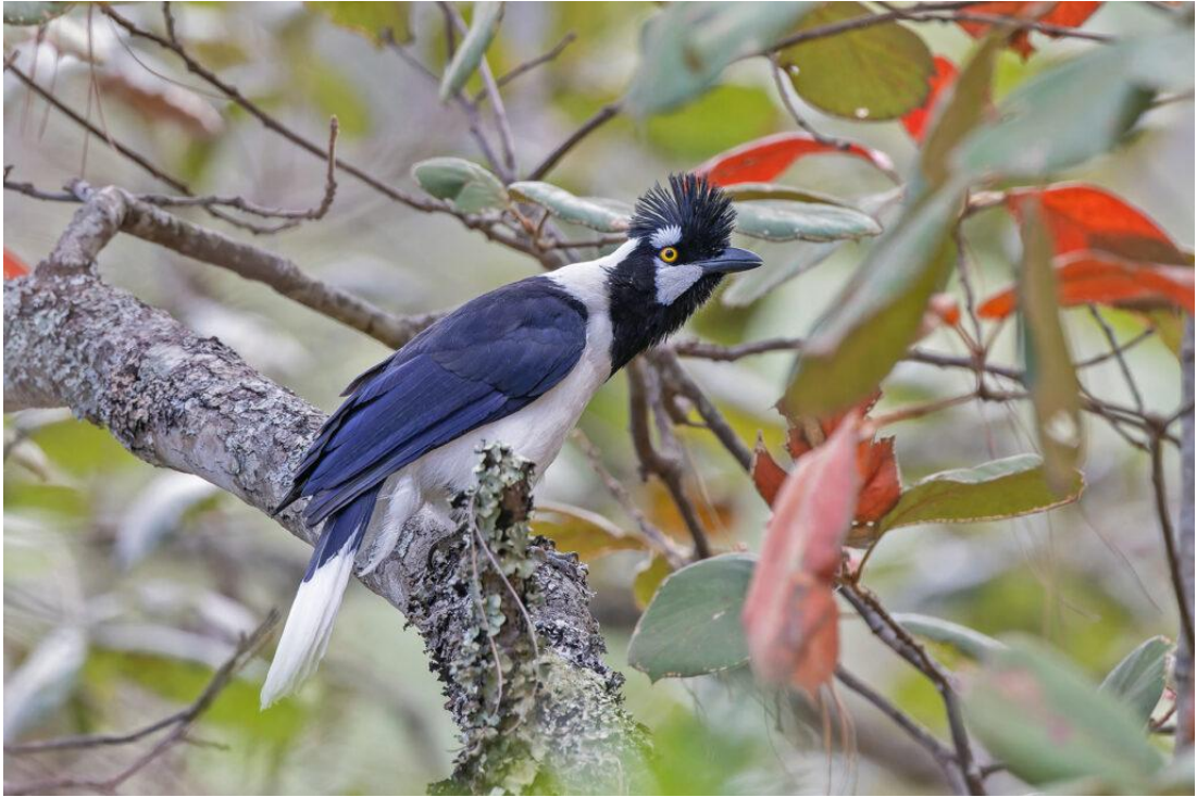
Tufted Jay