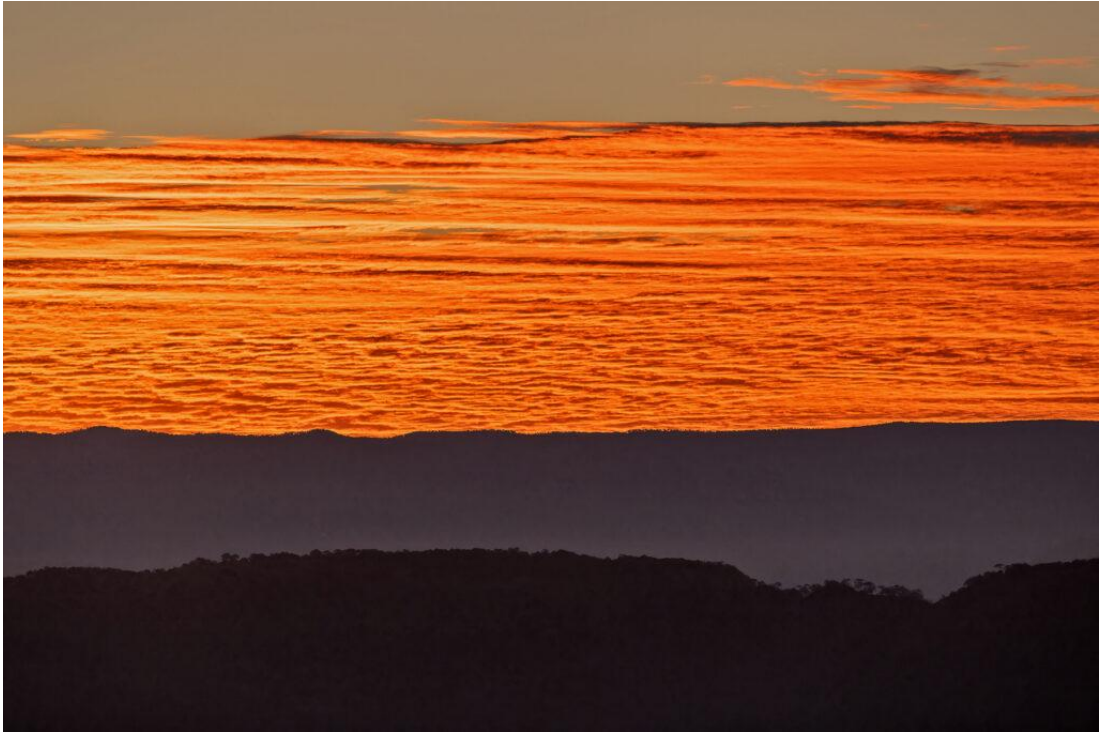
sunrise at Durango Highway