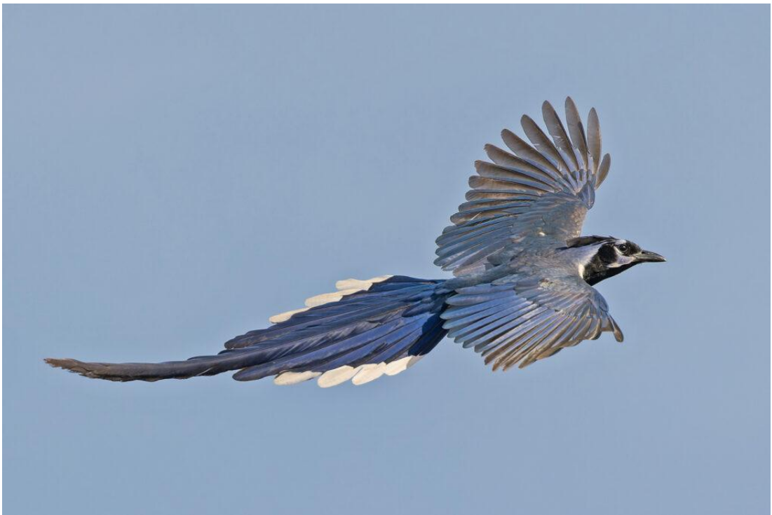
Black-throated Magpie-Jay