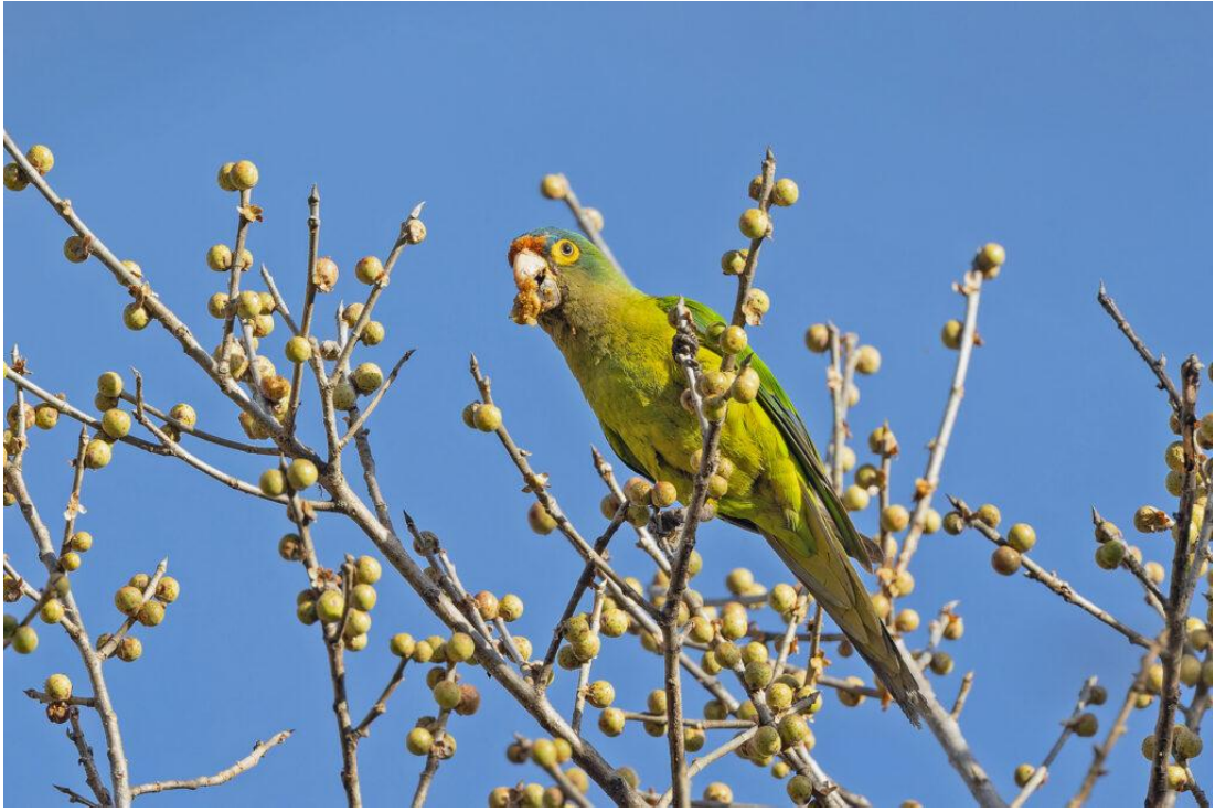
Orange-fronted Parakeet