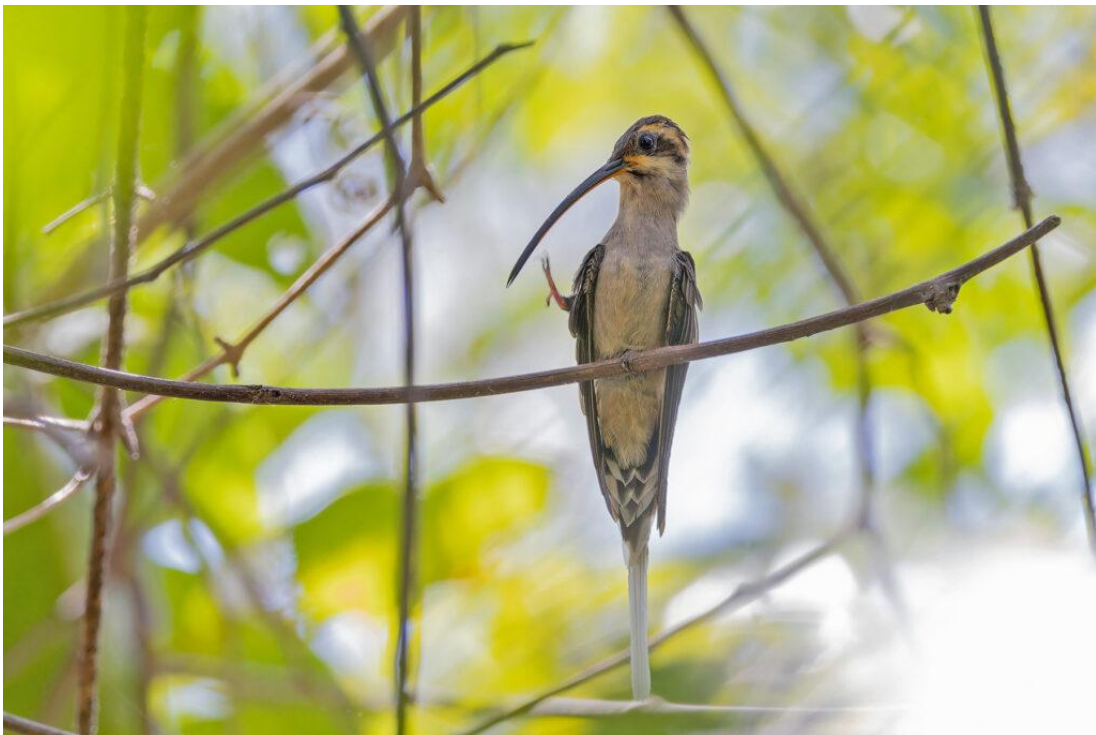
Mexican Hermit