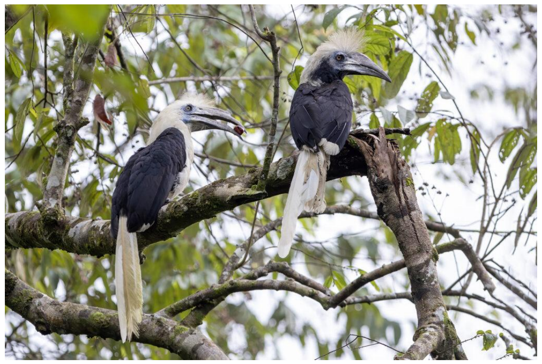
A pair of the ancient looking White-crowned Hornbill