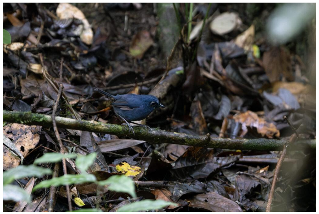
Bornean Shortwing