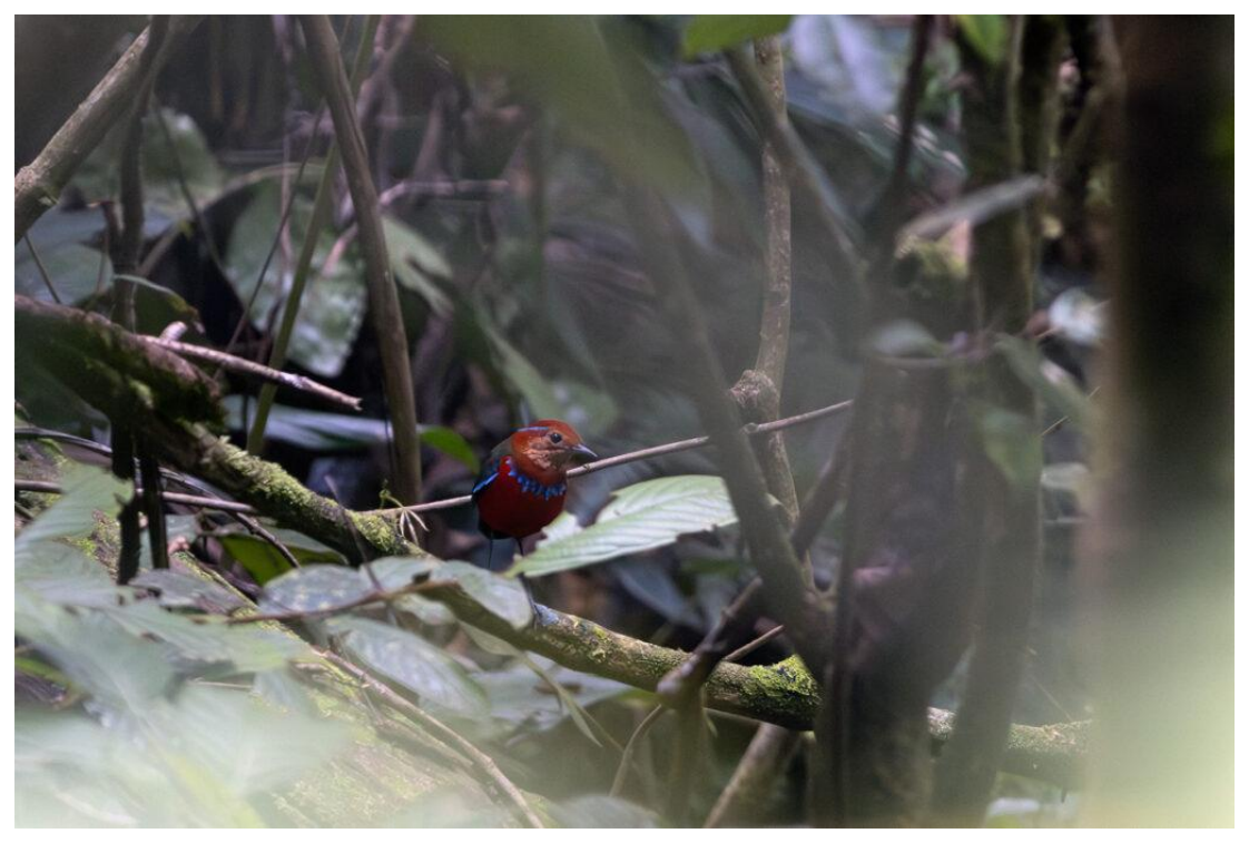
Blue-banded Pitta