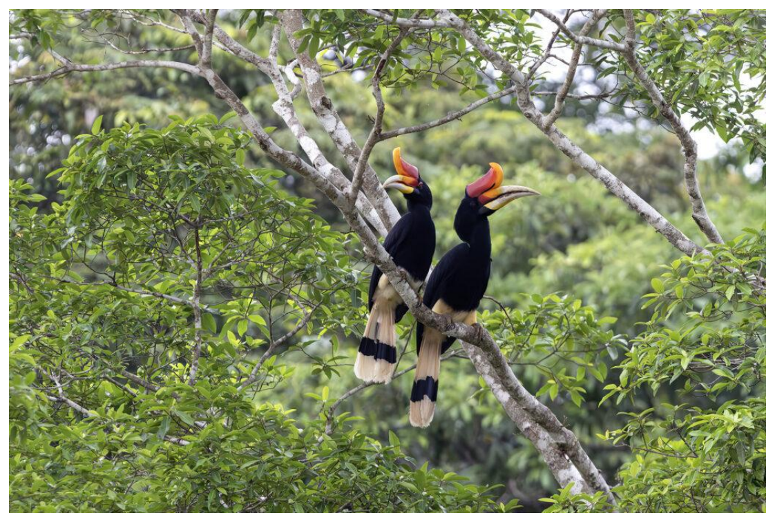
Rhinoceros Hornbill