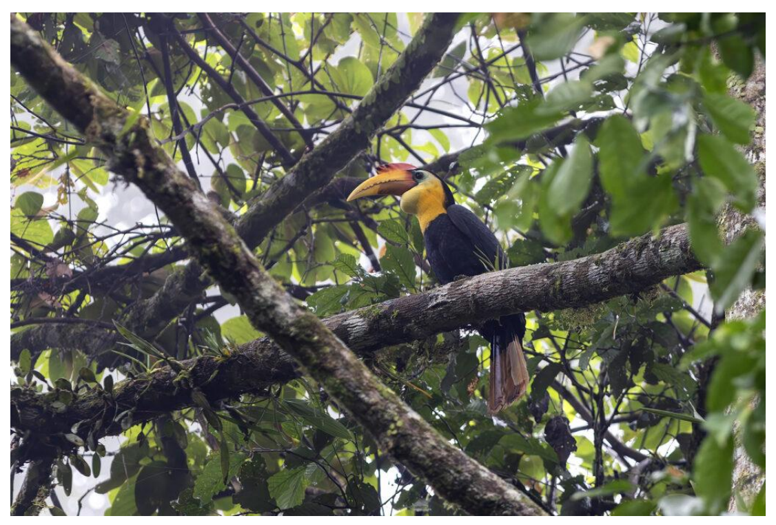
Wrinkled Hornbill