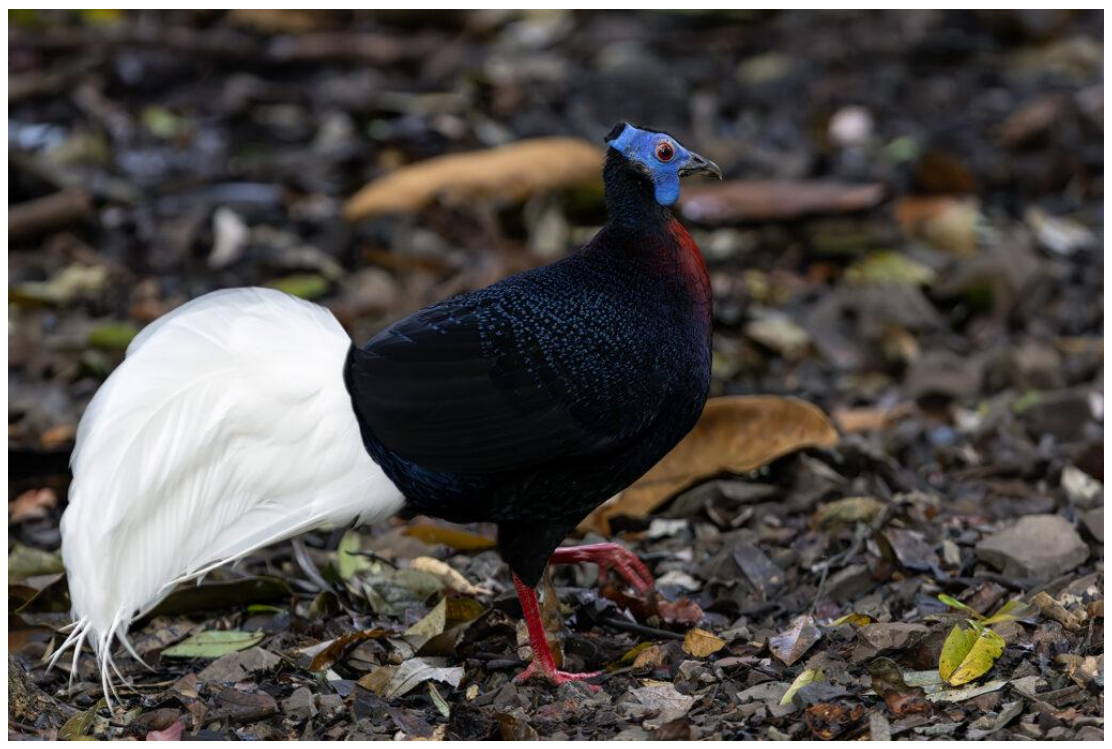
Bulwer's Pheasant