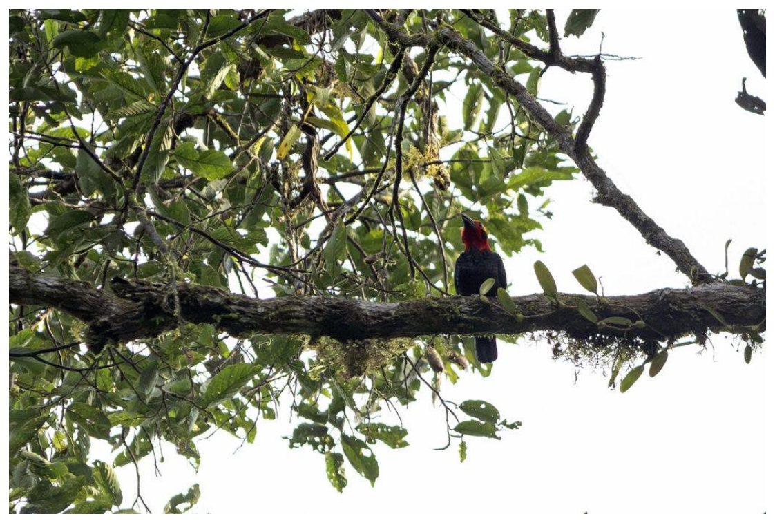
Bornean Bristlehead