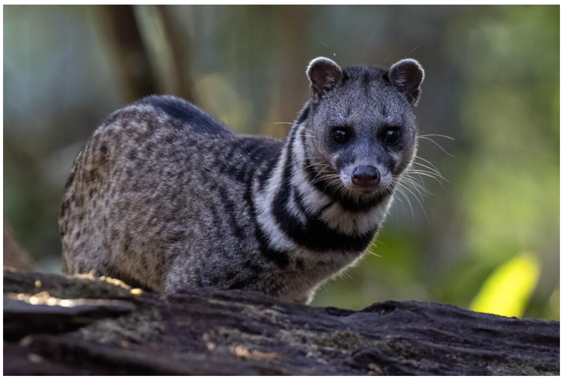
Malayan Civet