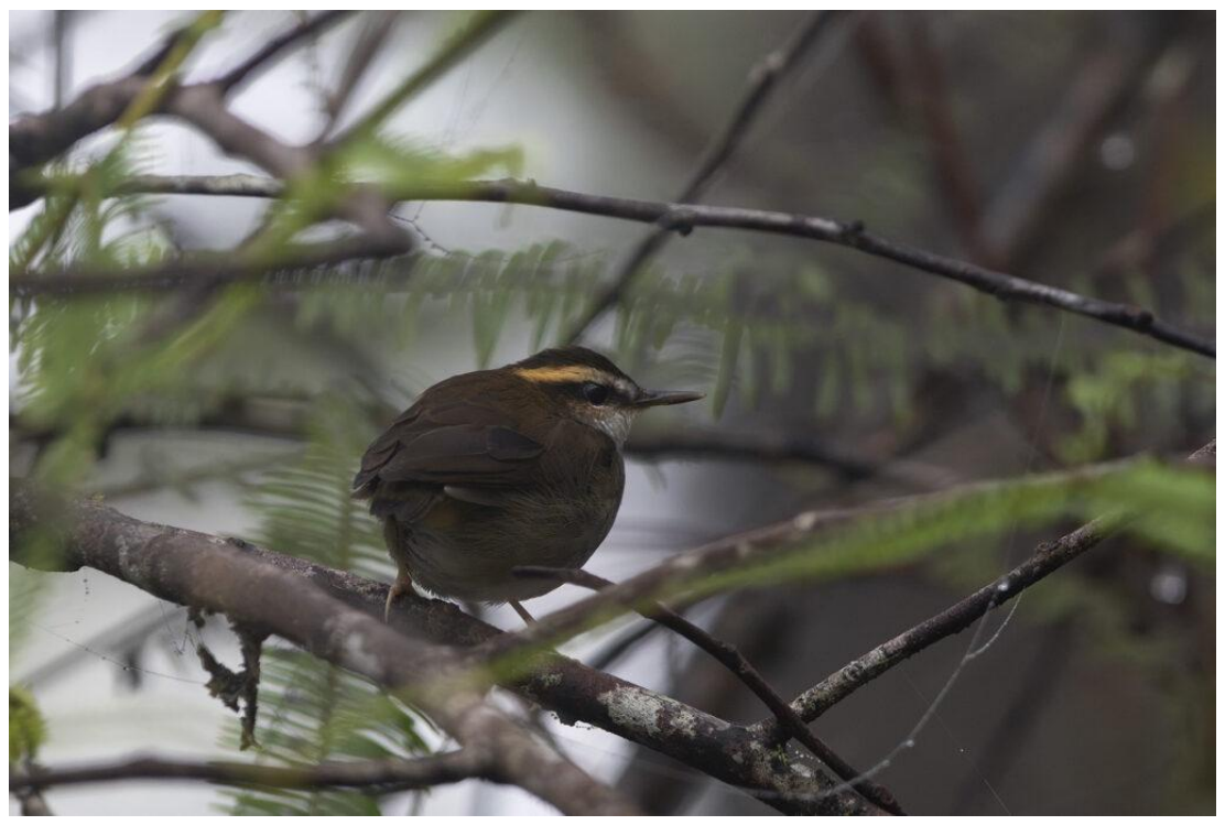
Bornean Stubtail