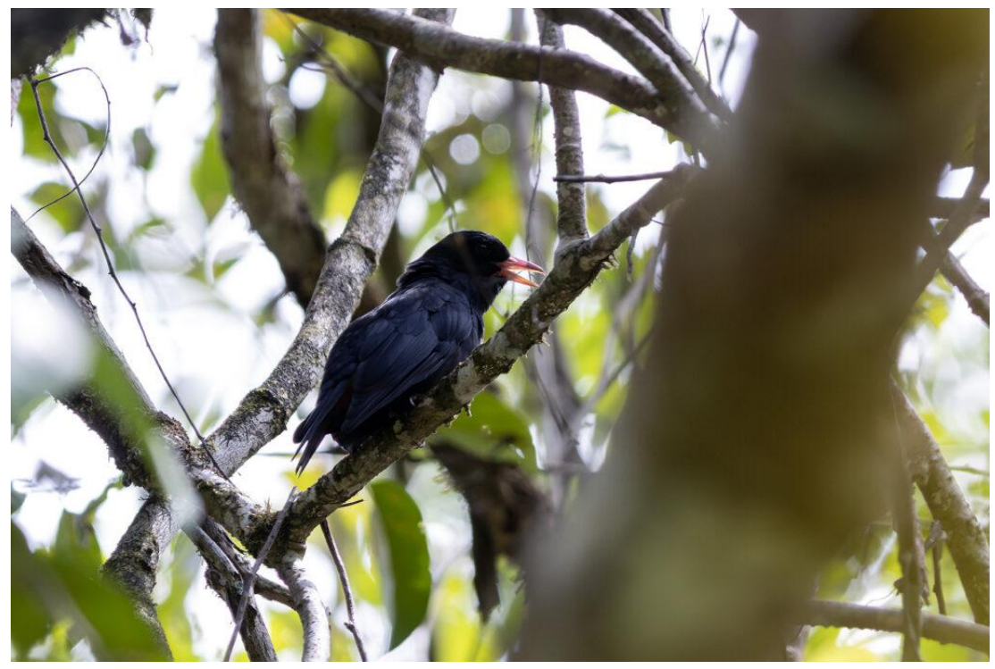
Singing male of the very localised Black Oriole