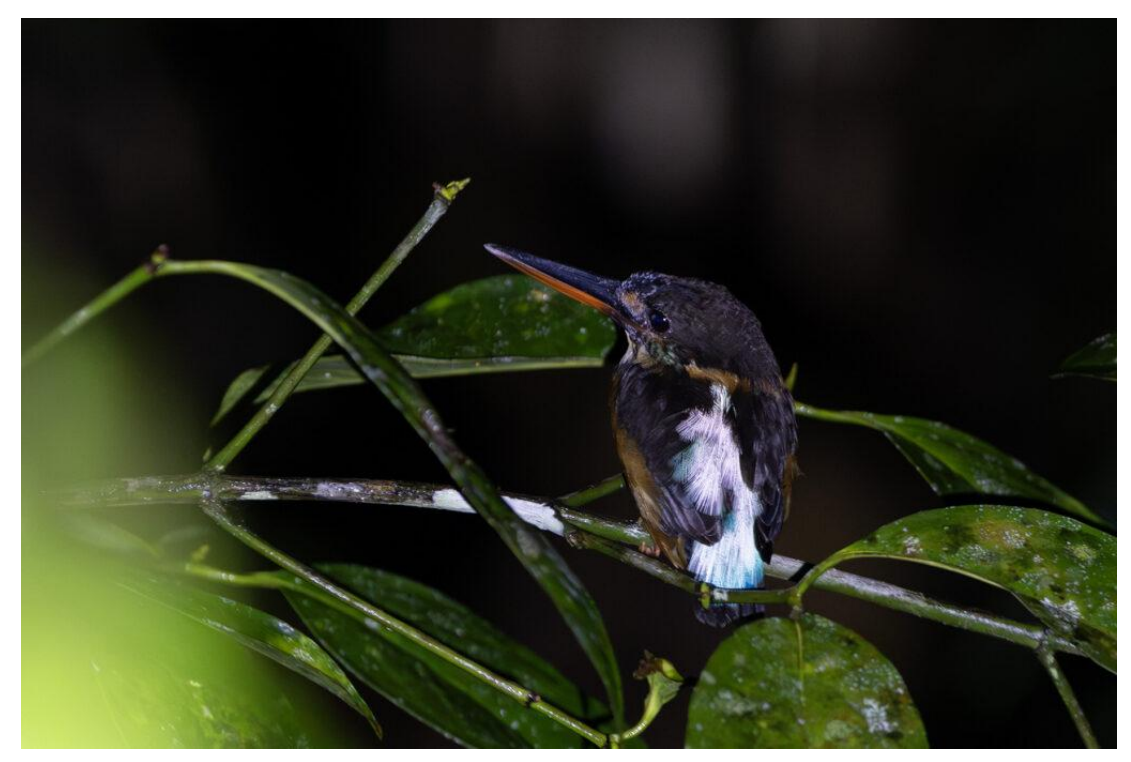
Malaysian Blue-banded Kingfisher