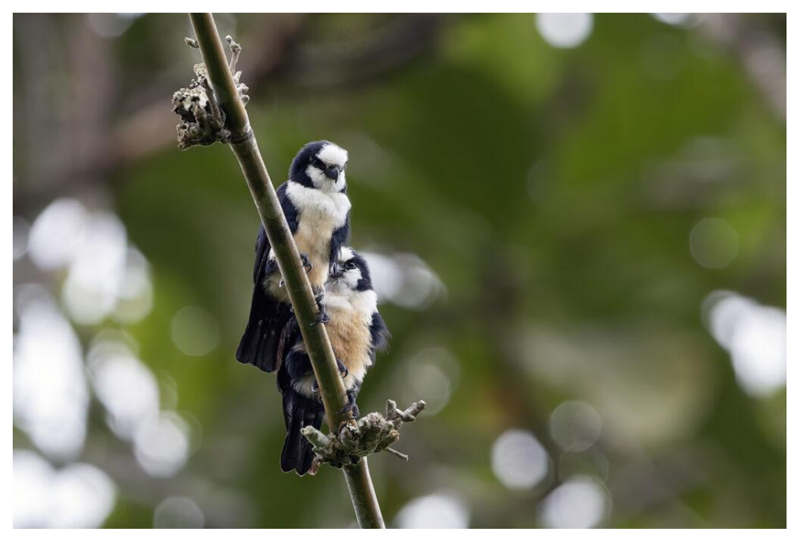
White-fronted Falconet