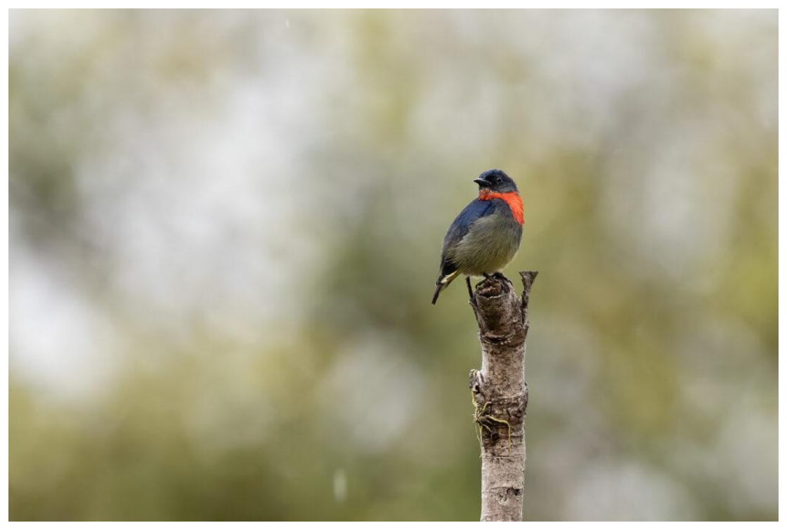
Black-sided Flowerpecker