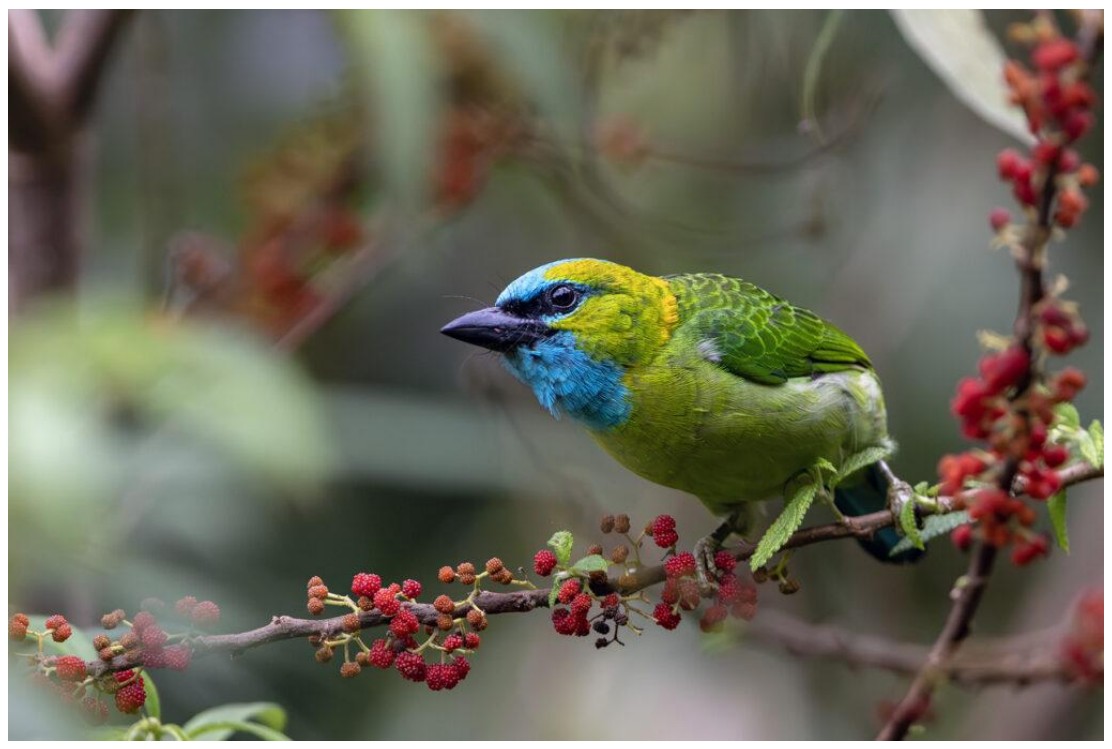
Golden-naped Barbet