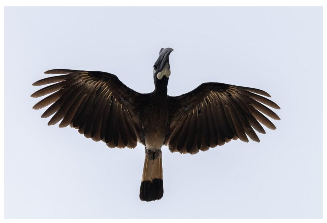
Bushy-crested Hornbill