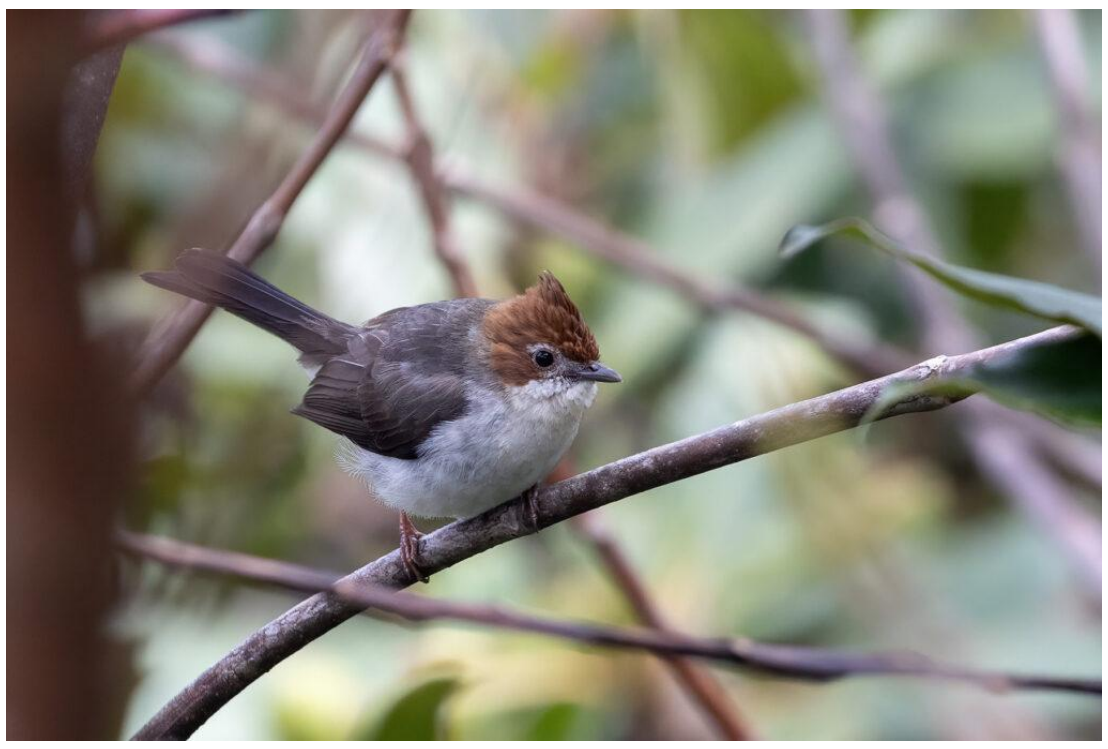
Chestnut-crested Yuhina