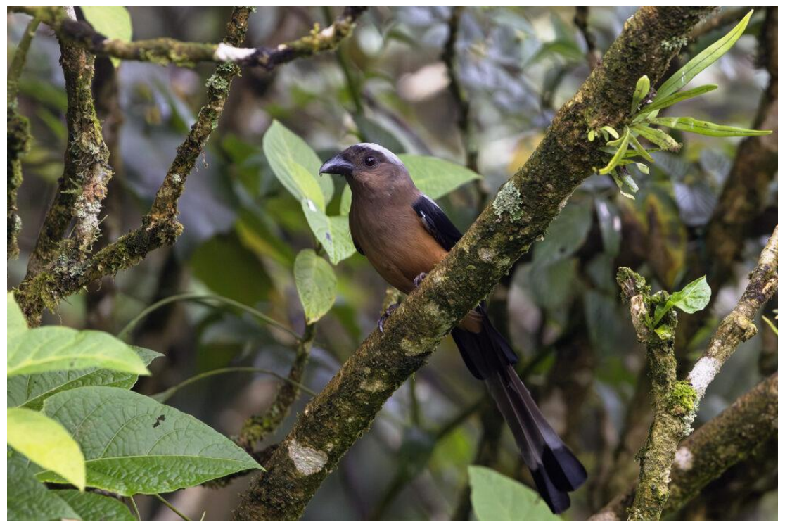
Bornean Treepie