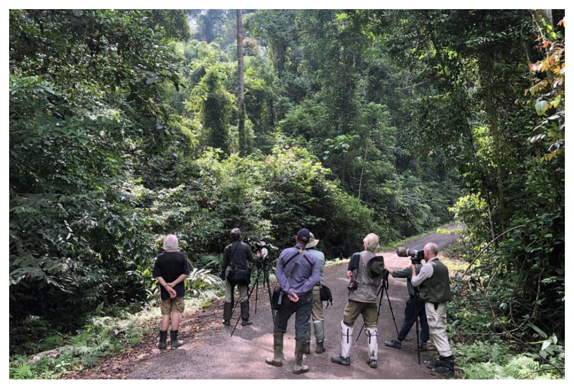
Birding in Danum Valley