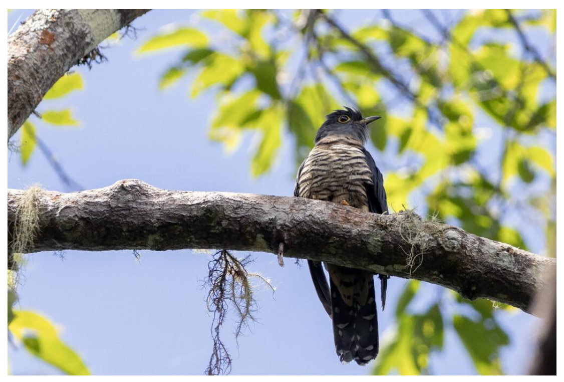
Sunda Cuckoo