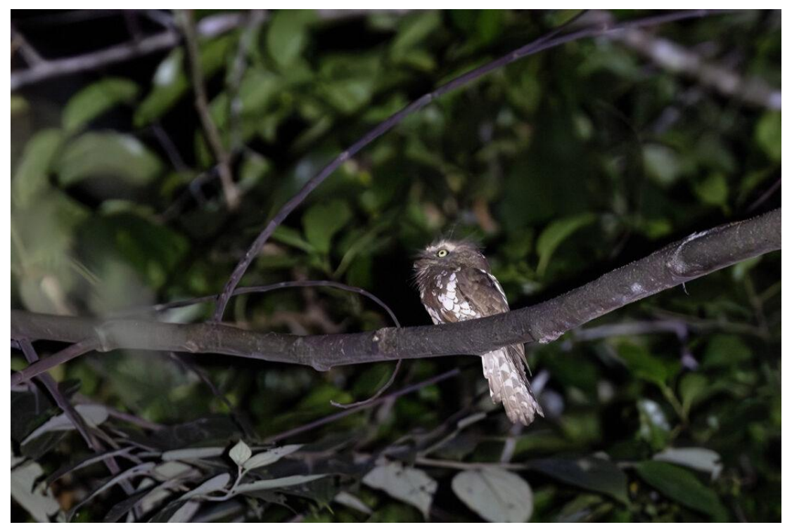
Bornean Frogmouth