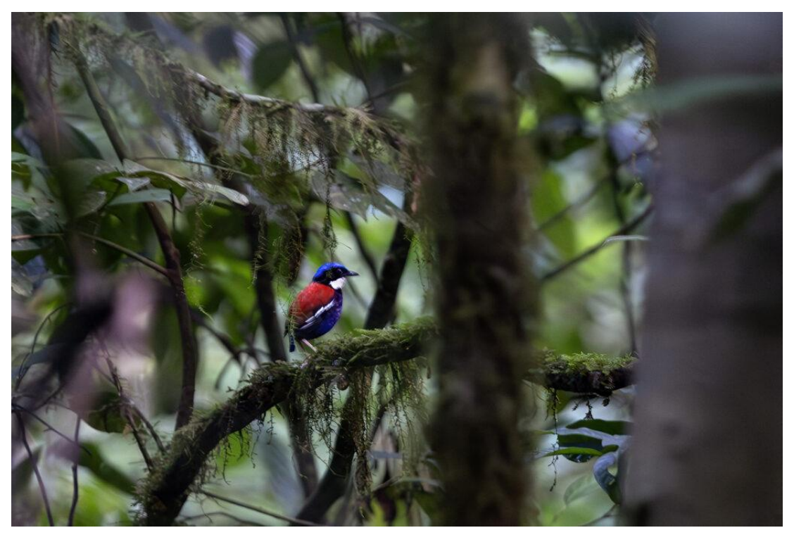
The stunning male of the Blue-headed Pitta is a real jewel of the forest floor