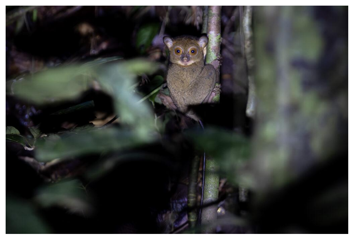
Horsfield's Tarsier