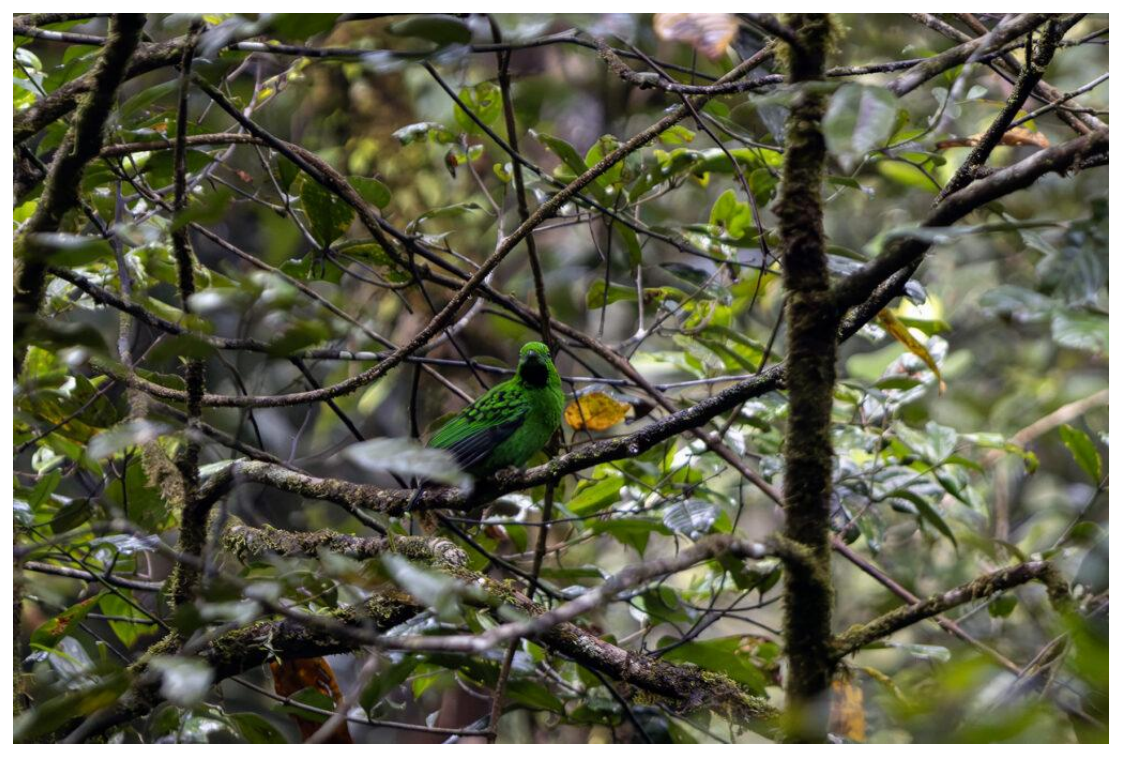
Whitehead's Broadbill