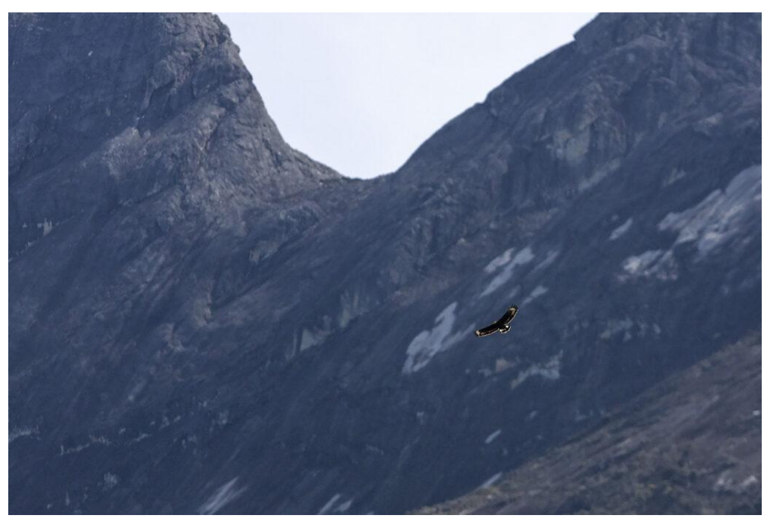
Mountain Hawk-Eagle, also known as Kinabalu Hawk-Eagle, soaring in front of Mt. Kinabalu