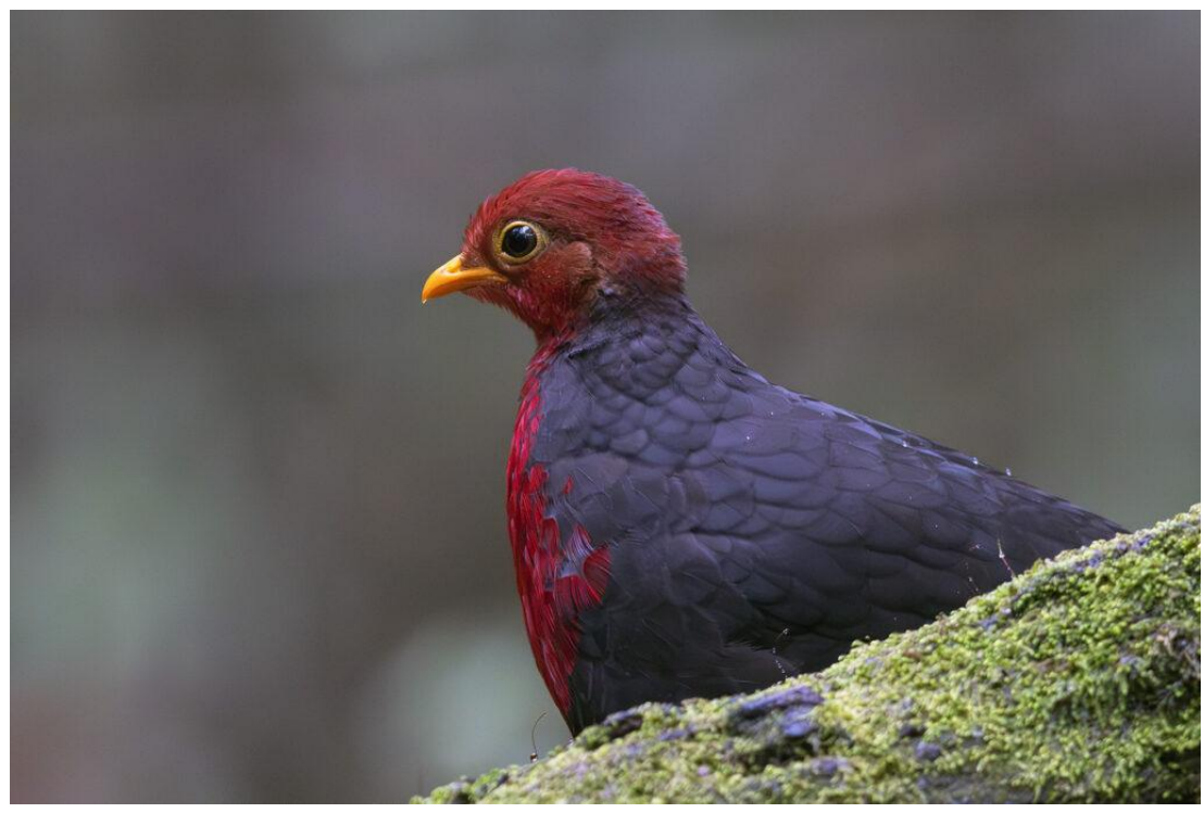
male Crimson-headed Partridge a.k.a. Bloodhead