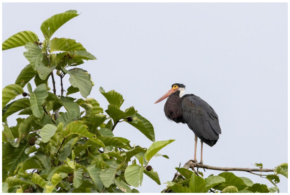
Storm's Stork