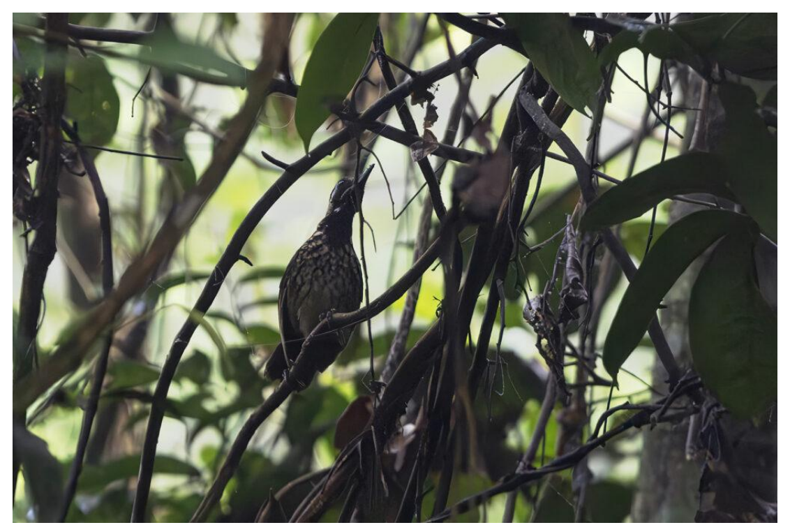
Black-throated Wren-Babbler