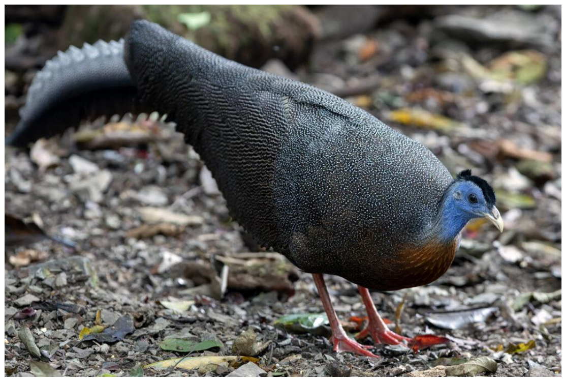
Great Argus