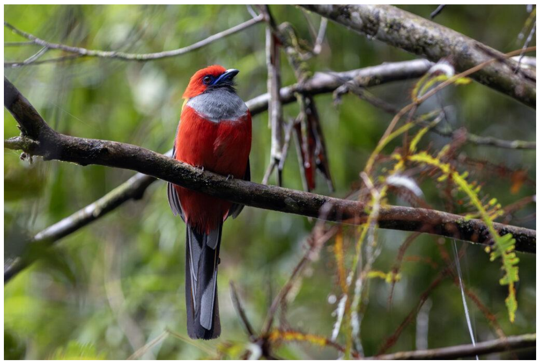
male Whitehead's Trogon