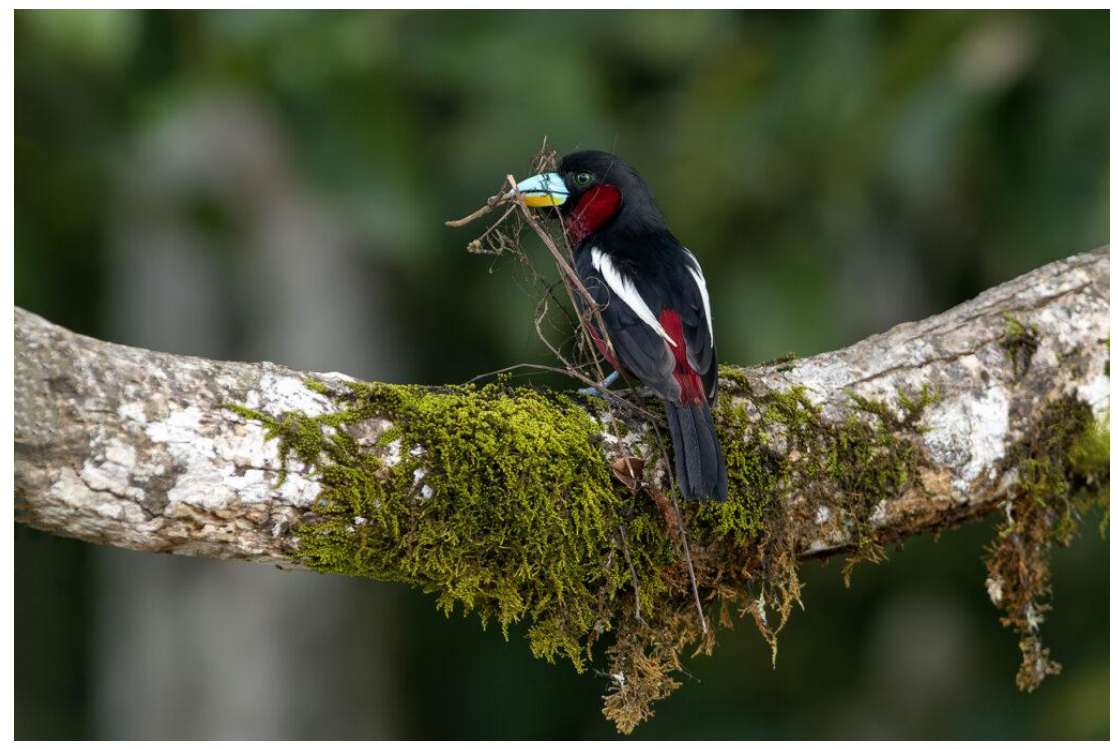
Black-and-red Broadbill