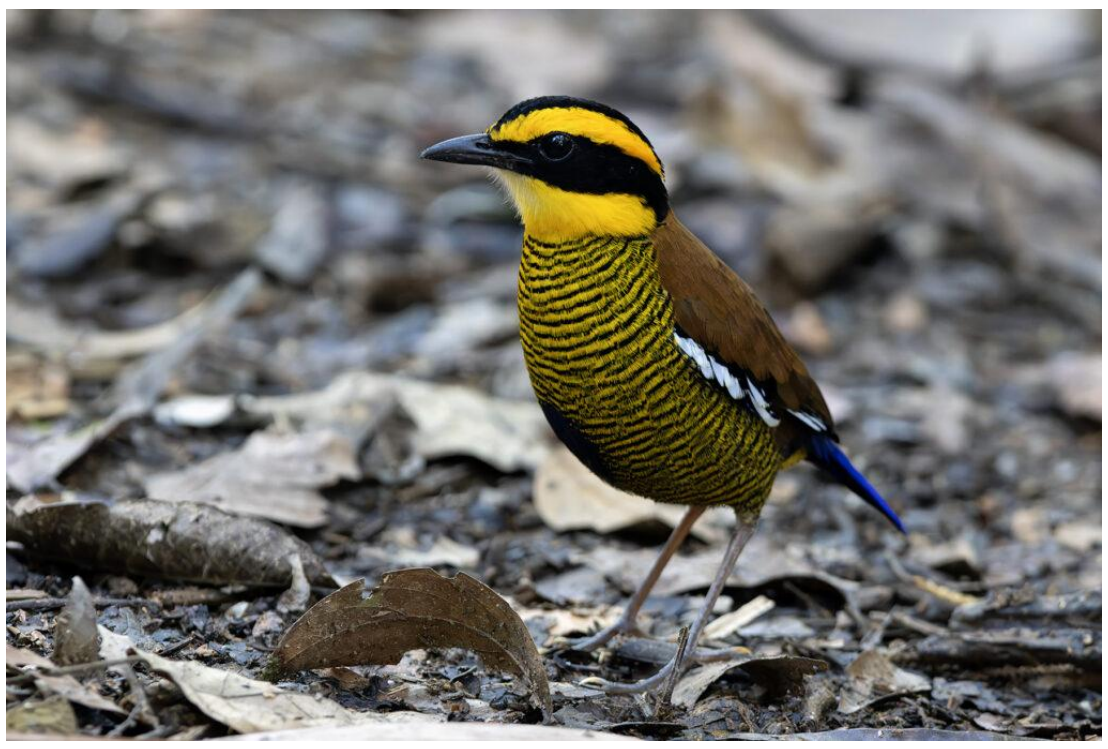
Male Bornean Banded Pitta – another gem from the forest floor