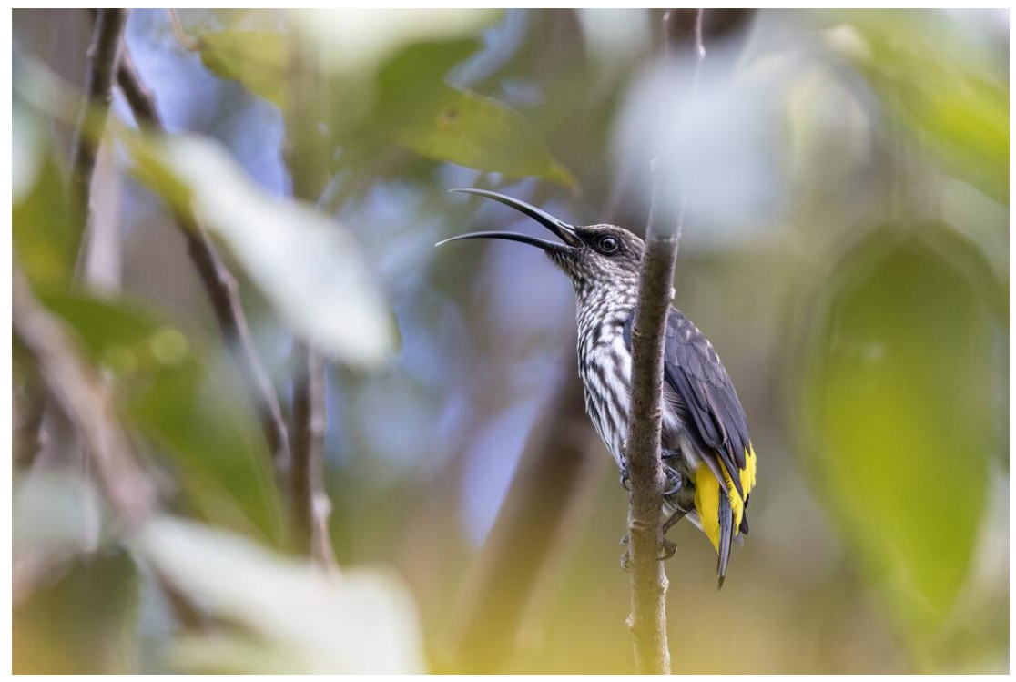
Whitehead's Spiderhunter