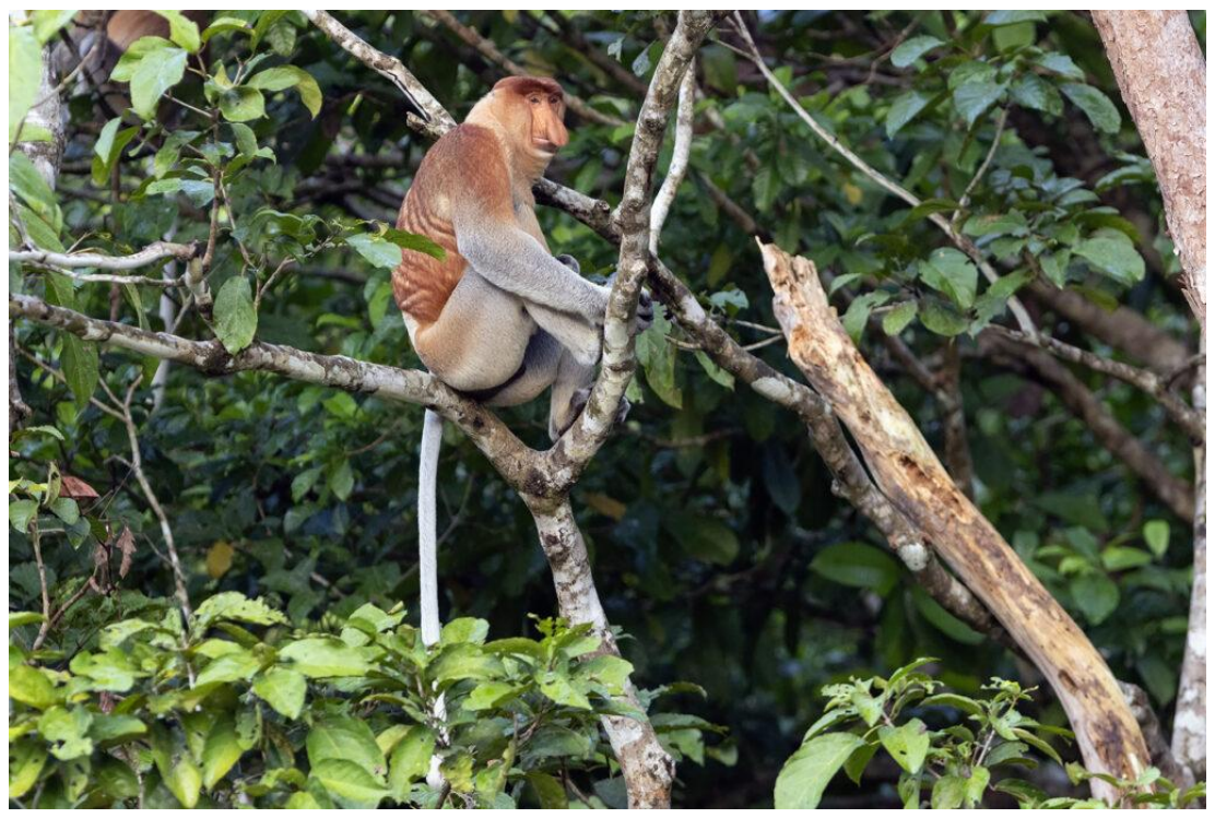
Proboscis Monkey