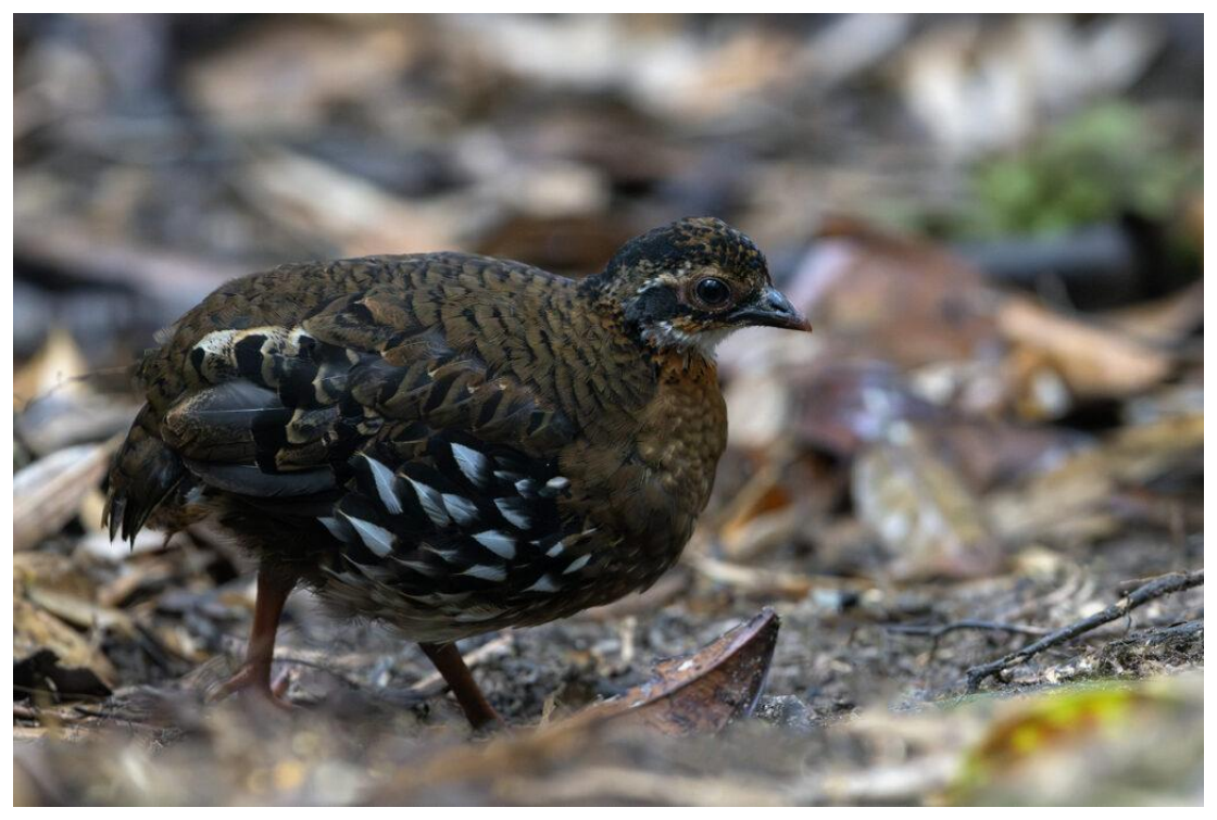
Red-breasted Partridge