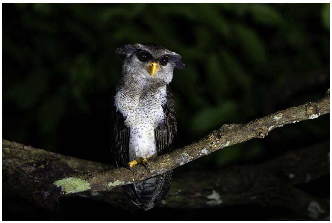
Barred Eagle Owl