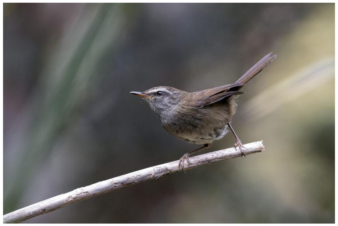
Sunda Bush Warbler was recently lumped back into Aberrant Bush Warbler