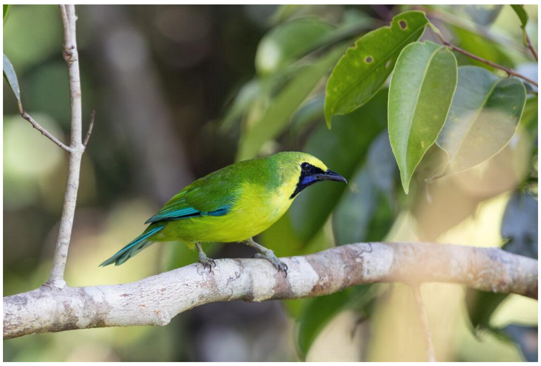
Bornean Leafbird