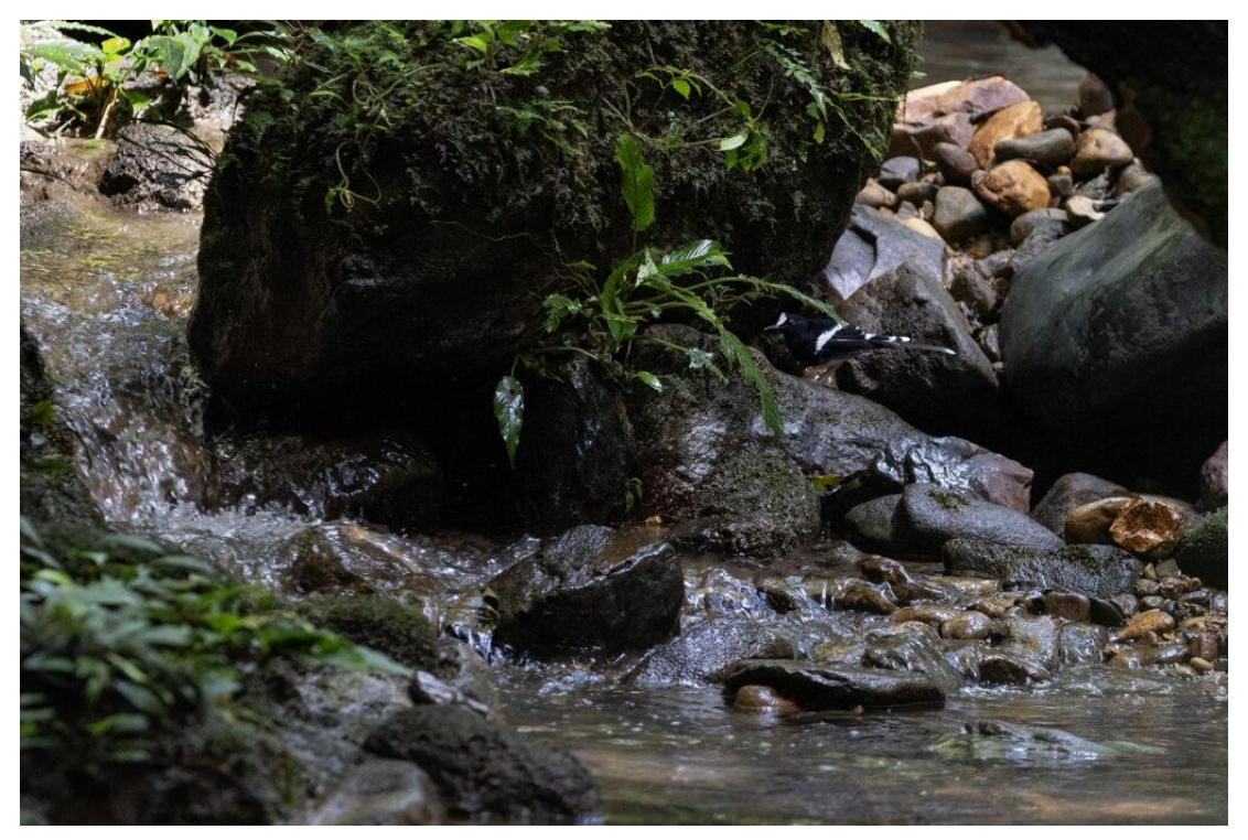
Bornean Forktail