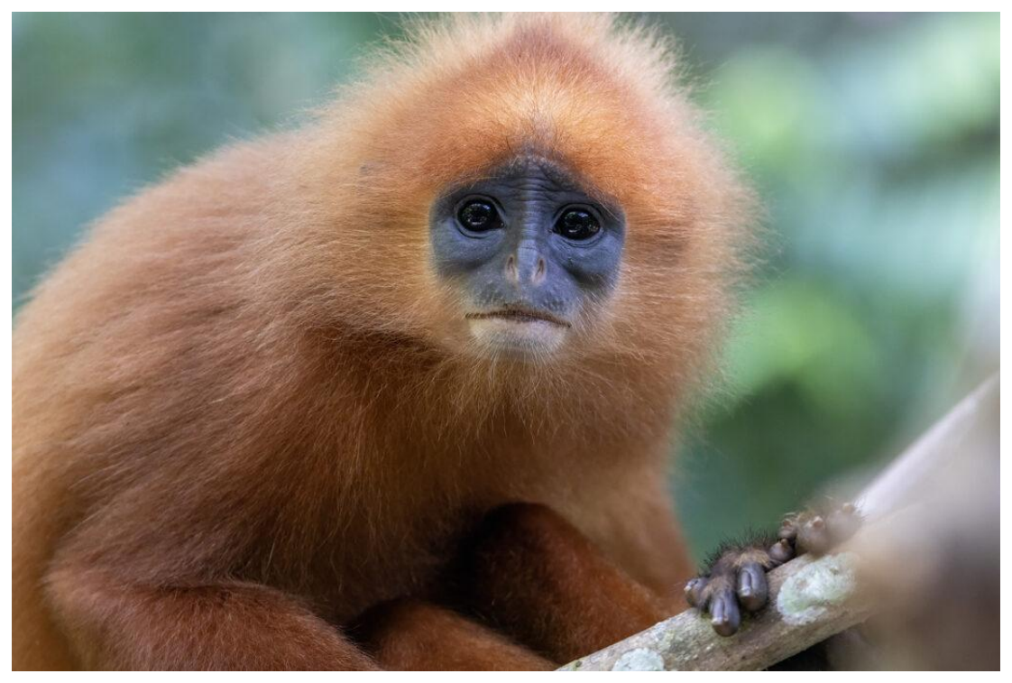
Maroon Leaf Monkey