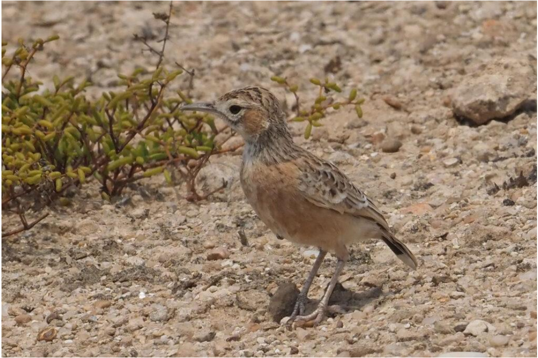
Spike-heeled Lark