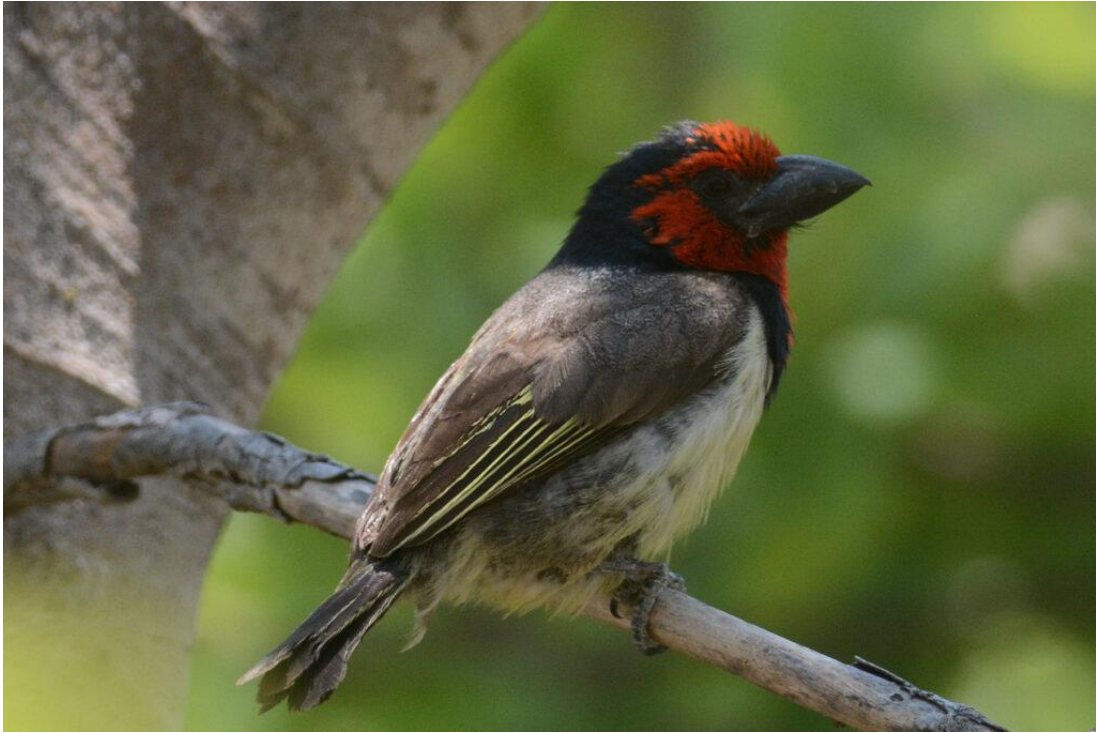
Black-collared Barbet