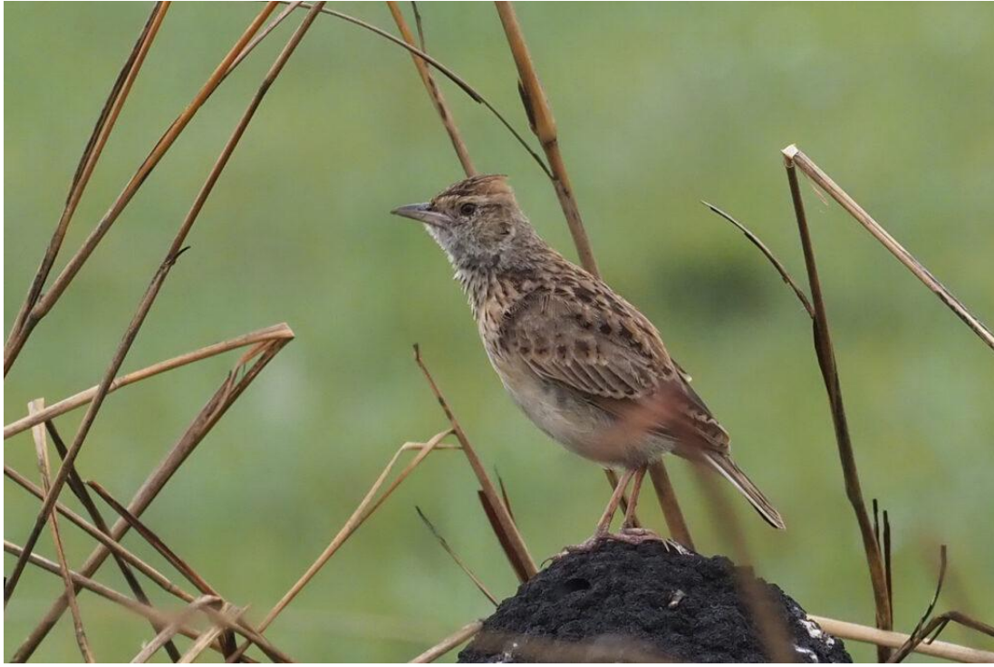
Angola Lark