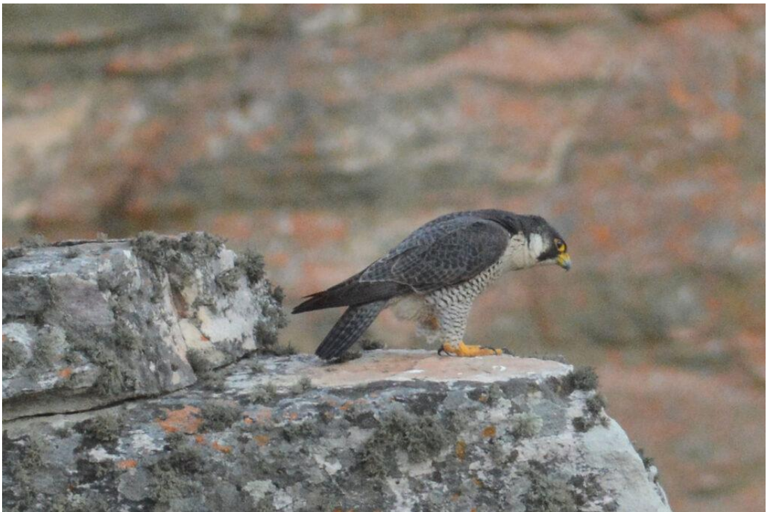
Peregrine Falcon