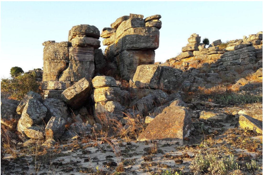
Tundavala escarpment