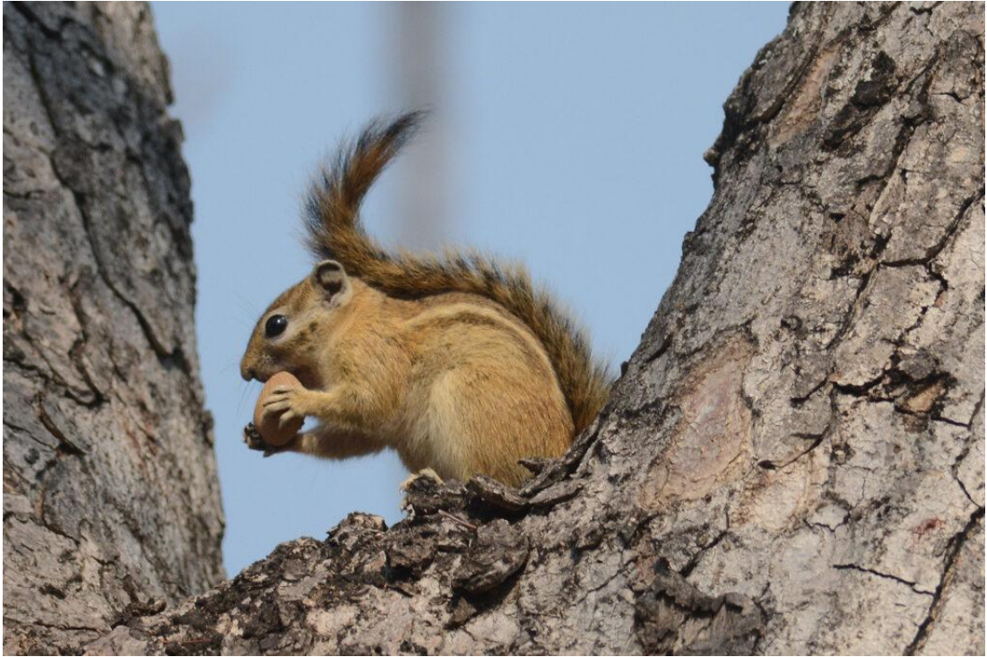
Congo Rope Squirrel