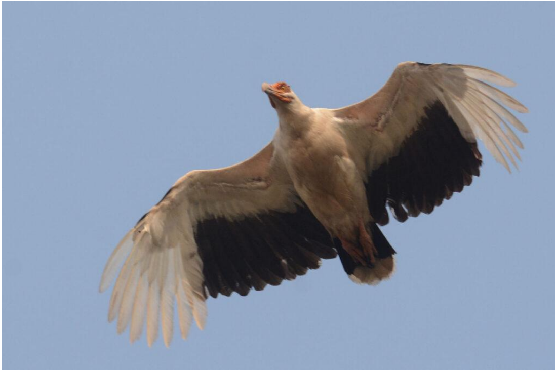
Palm-nut Vulture