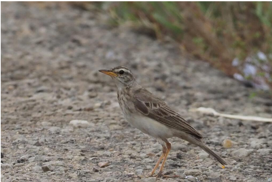
Long-legged Pipit