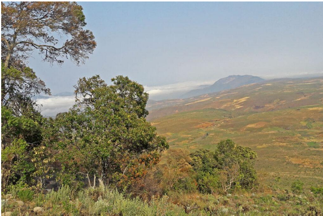
Mount Moco