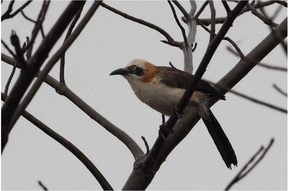
Bare-cheeked Babbler