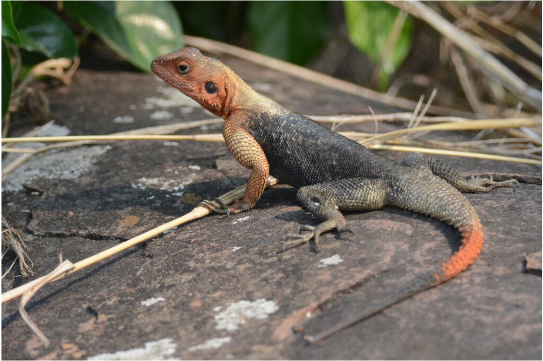
Agama Lizard