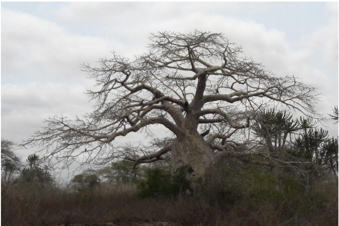
Baobab