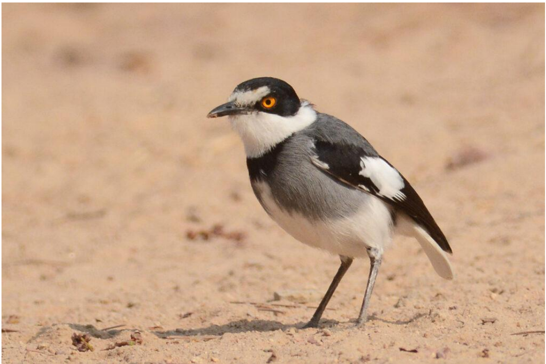
White-tailed Shrike