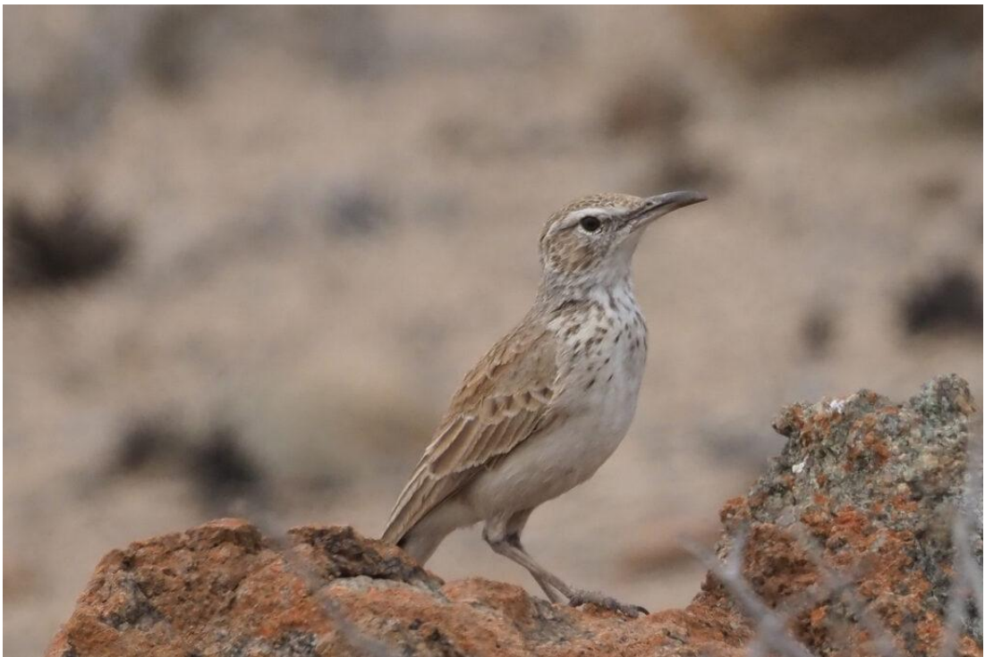
Benguela Long-billed Lark