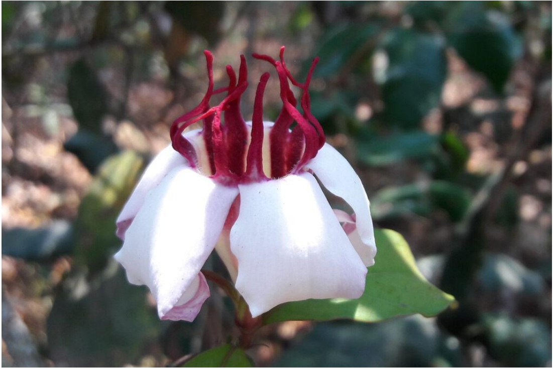
Kinjila flower