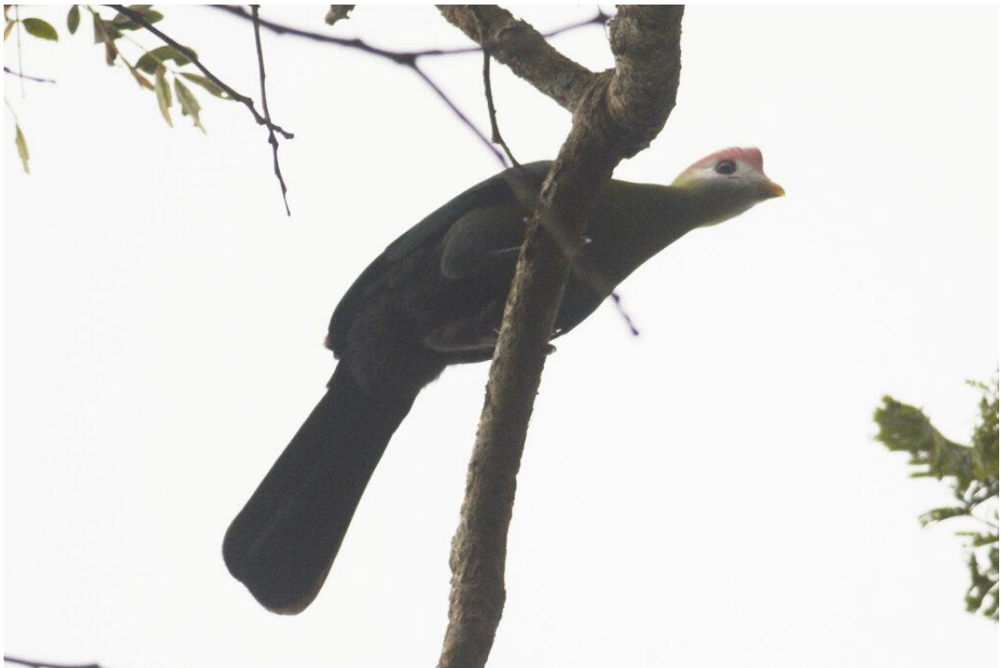
Red-crested Turaco