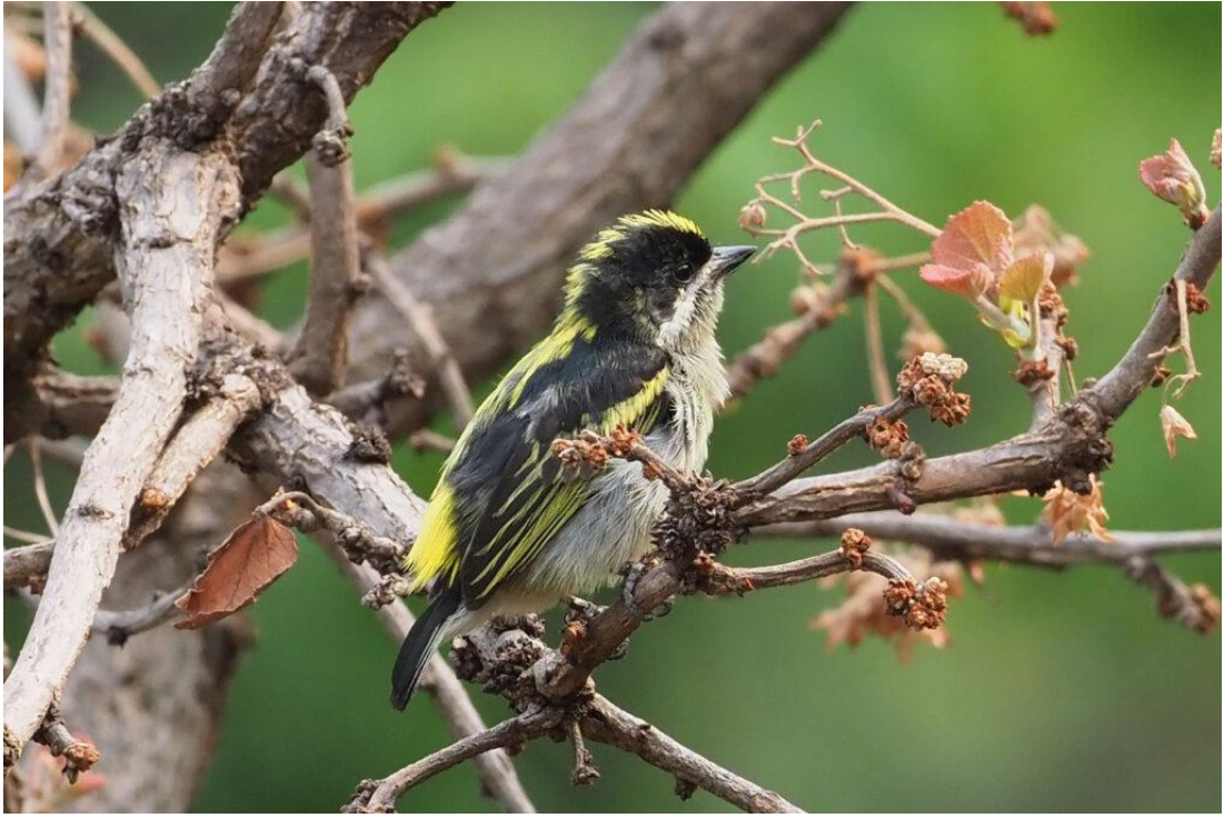
Western Green Tinkerbird