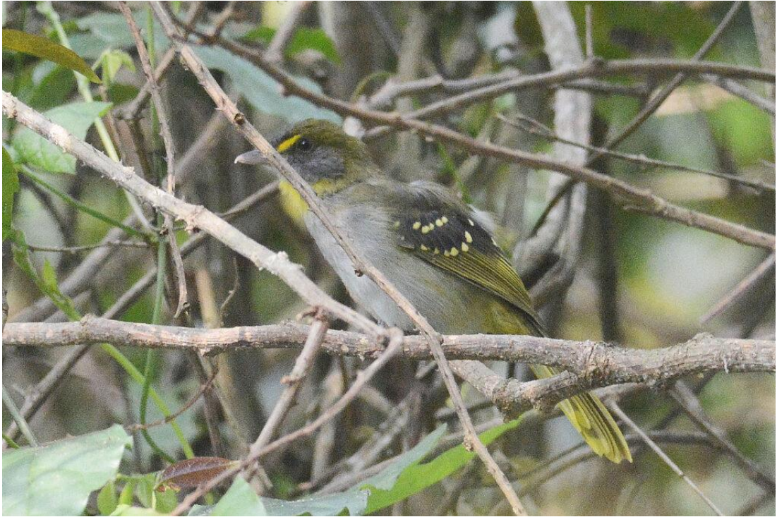
Yellow-throated Nicator