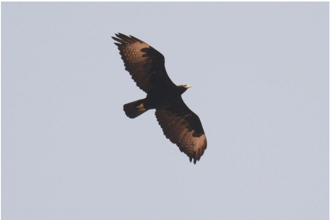
Verreaux's Eagle