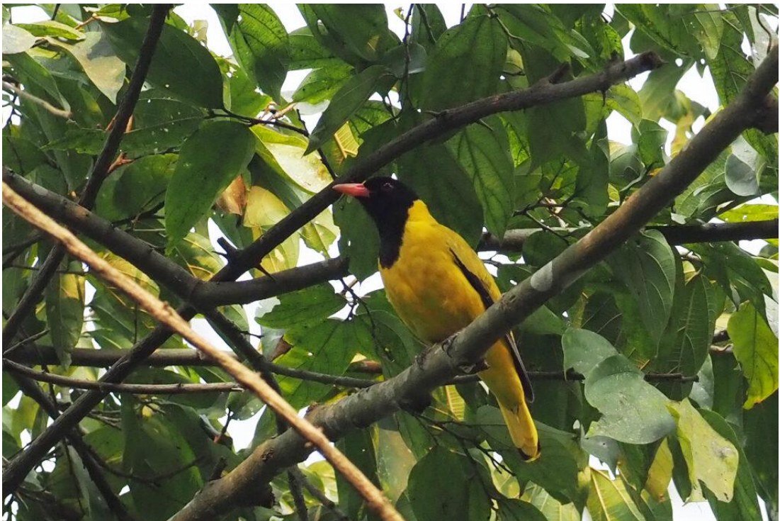
Black-winged Oriole