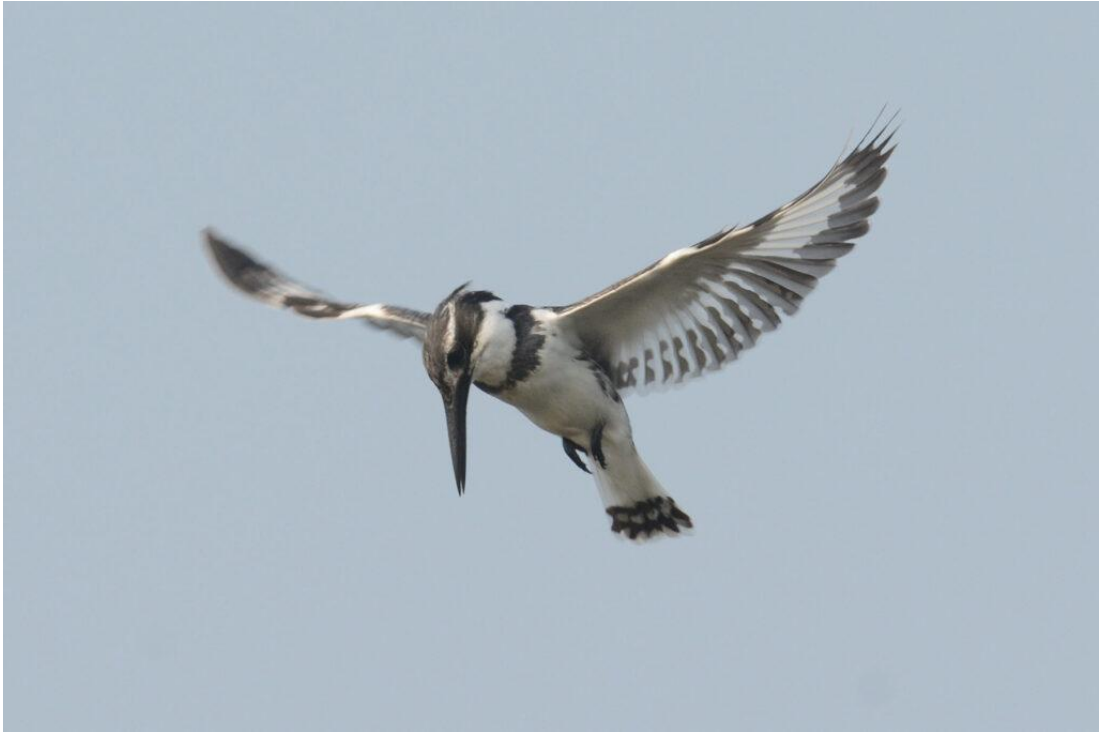
Pied Kingfisher