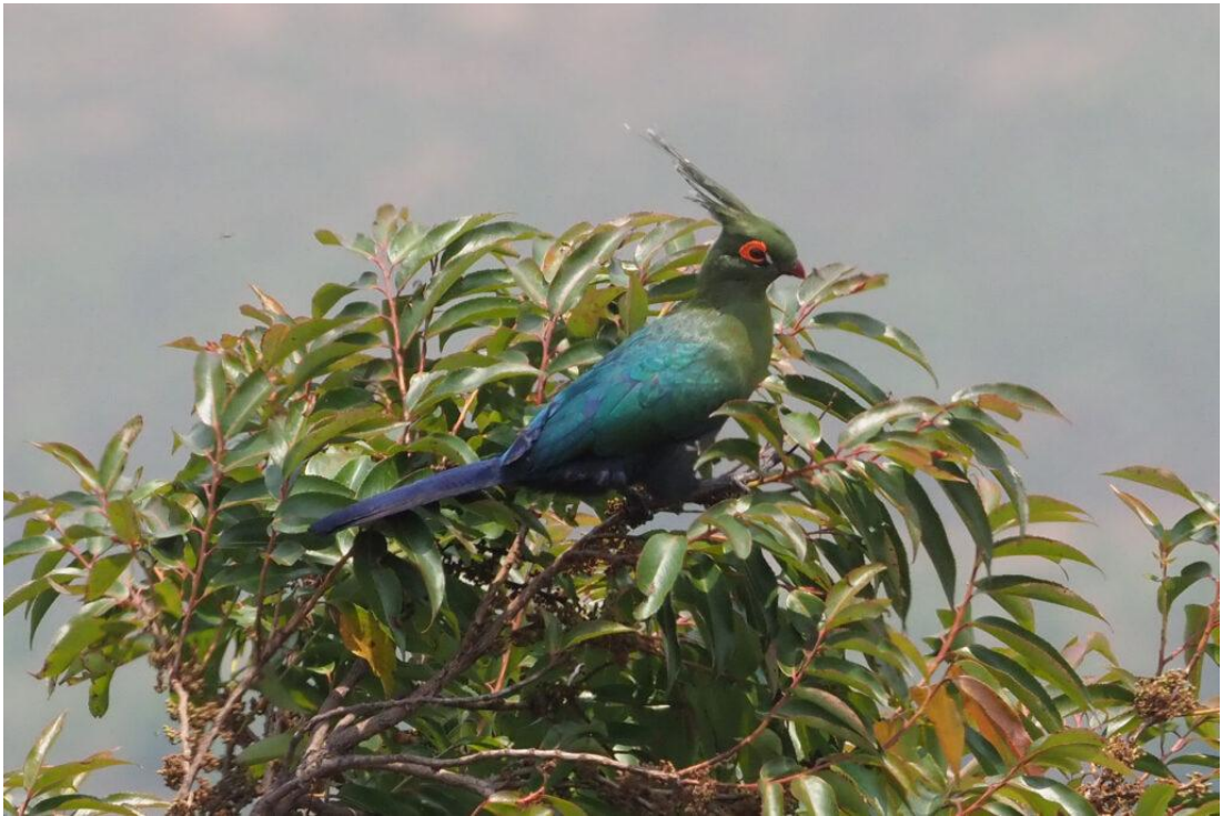
Schalow's Turaco