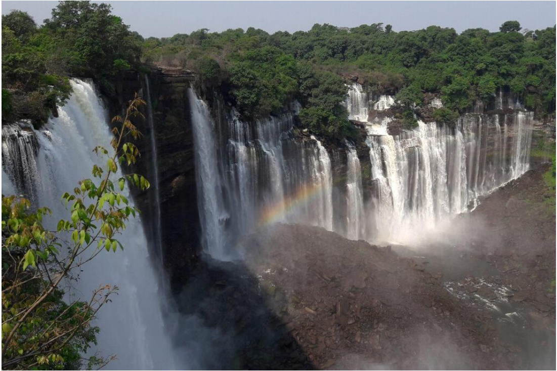
Calandula Fall