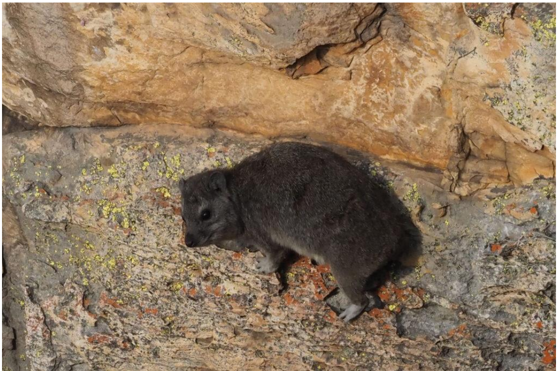
Bush Hyrax