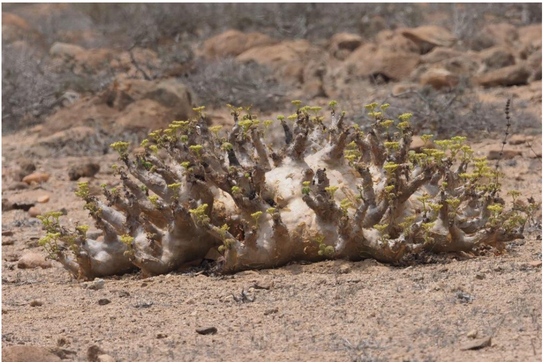
Pachypodium sp