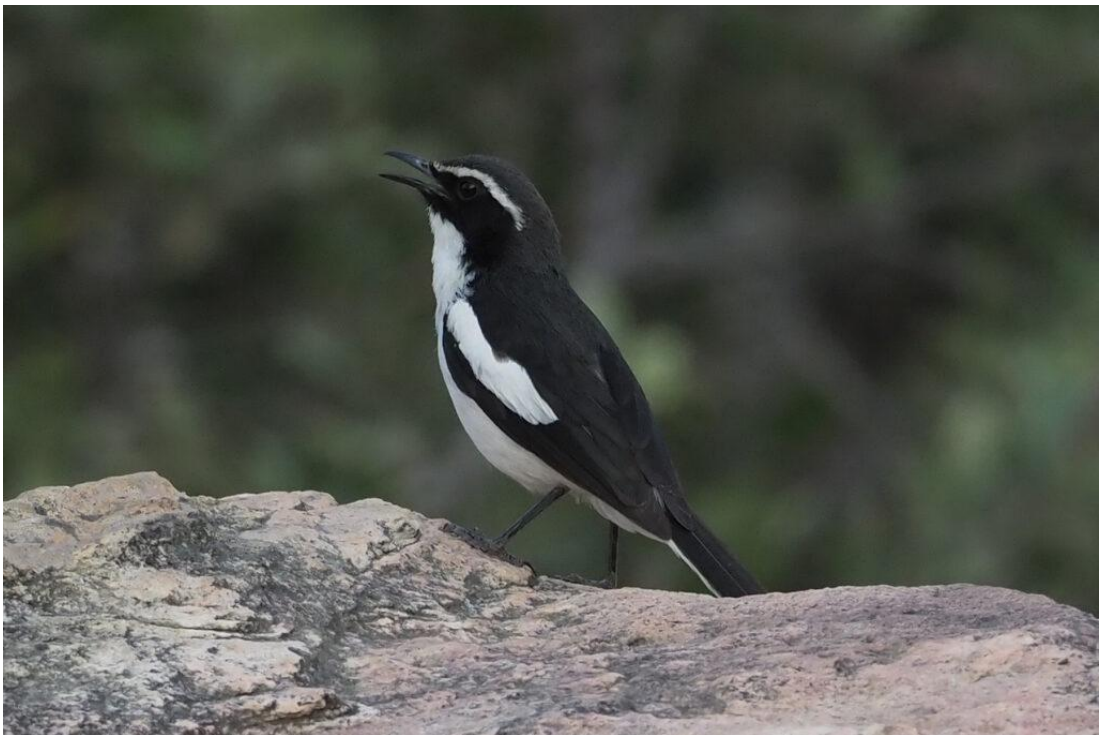
Angola Cave Chat