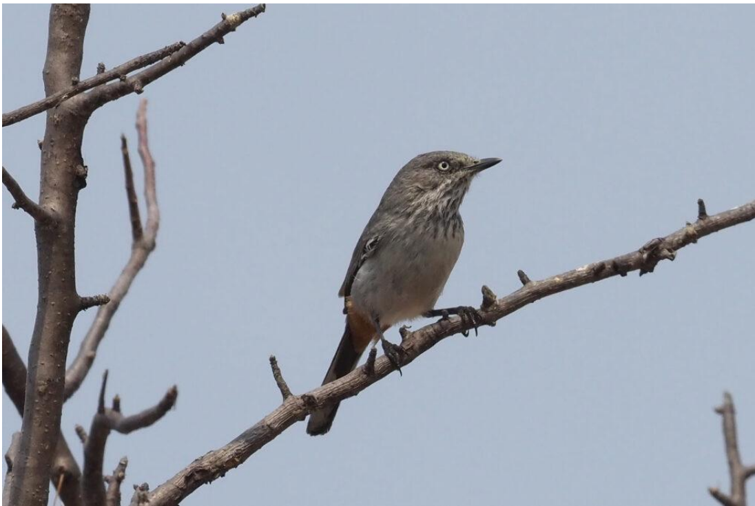
Chestnut-vented Warbler