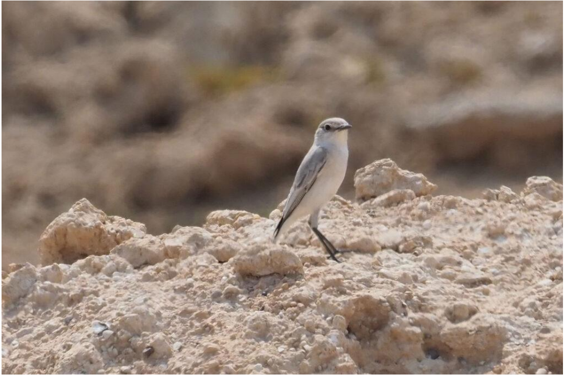
Tractrac Chat