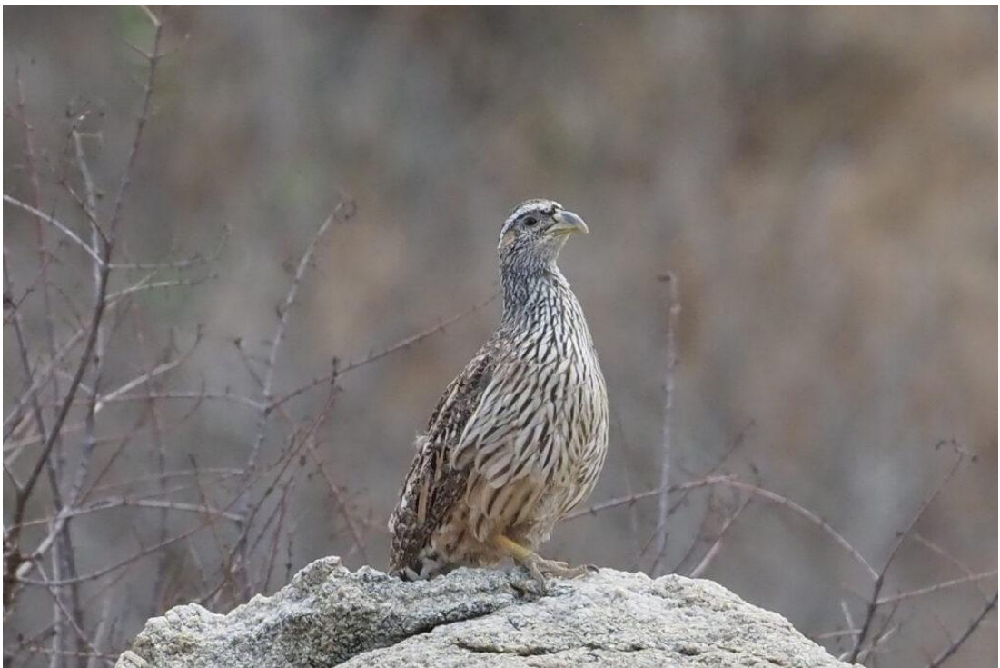
Hartlaub's Spurfowl