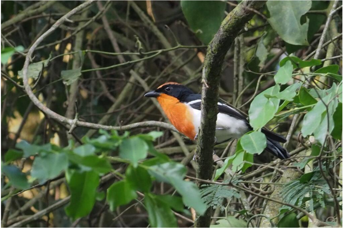
Braun's Bushshrike