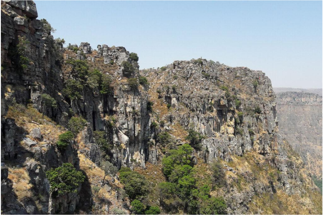
Tundavala escarpment