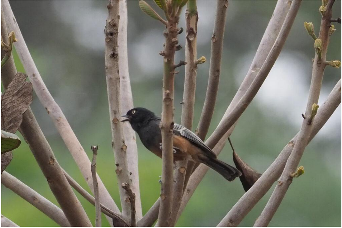
Rufous-bellied Tit