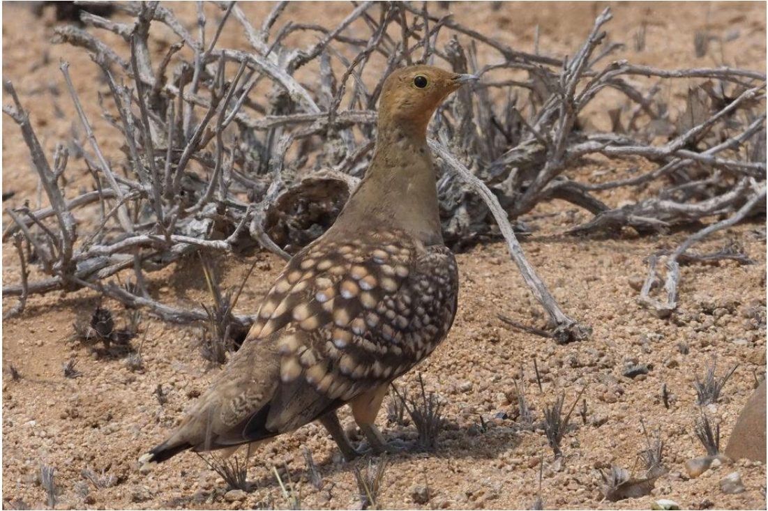
Namaqua Sandgrouse