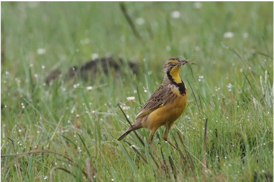
Fulleborn's Longclaw