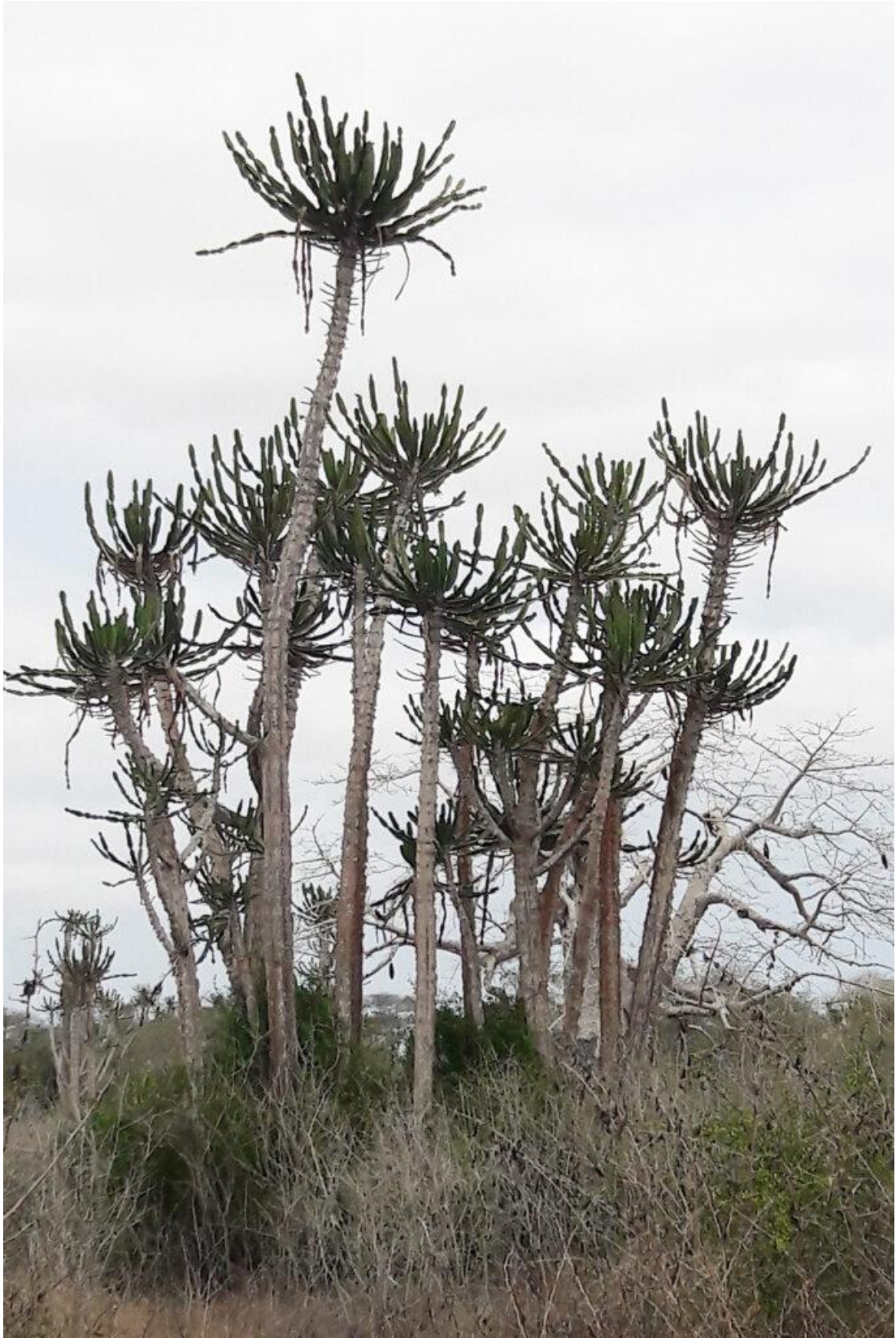
Euphorbia