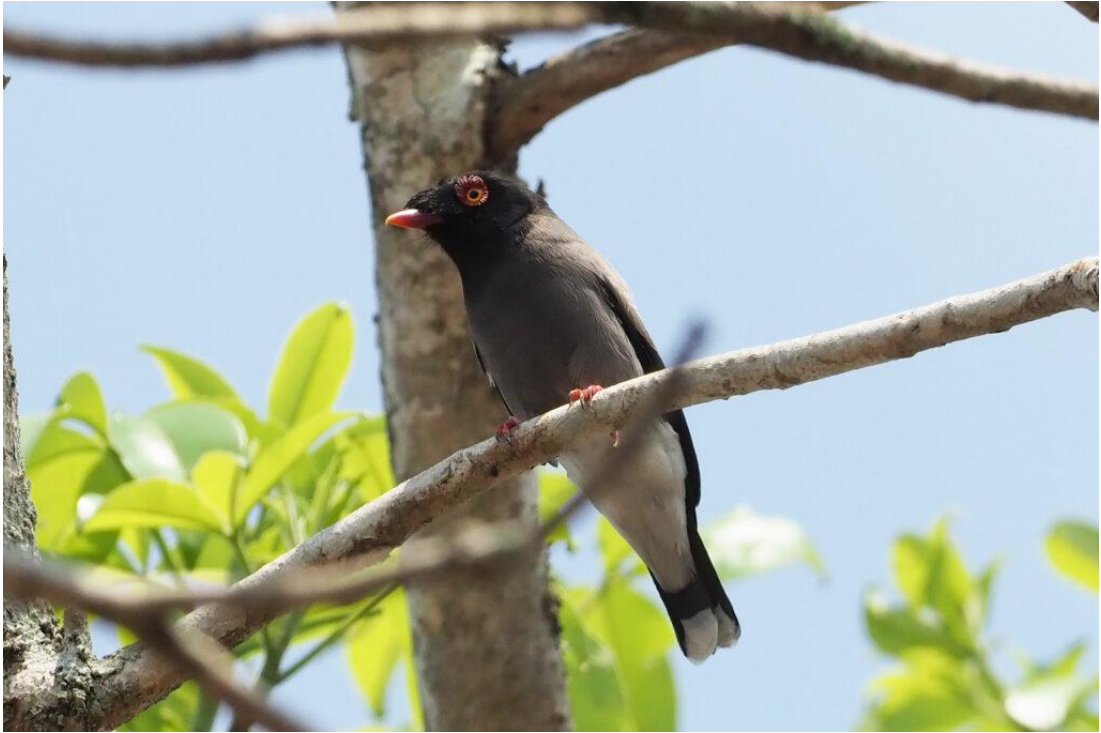
Gabela Helmetshrike