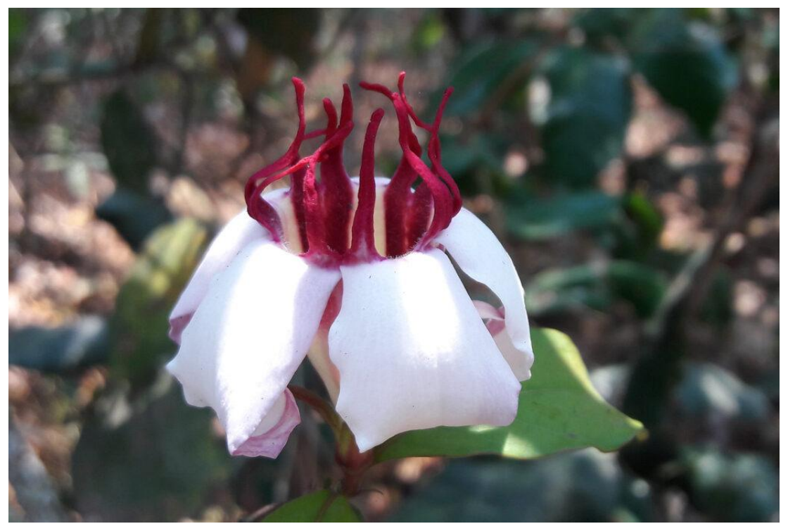
Kinjila flower