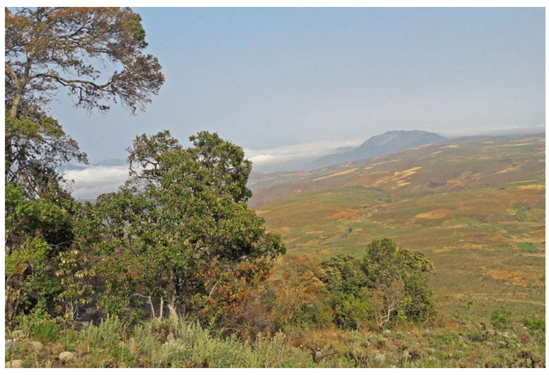
Mount Moco