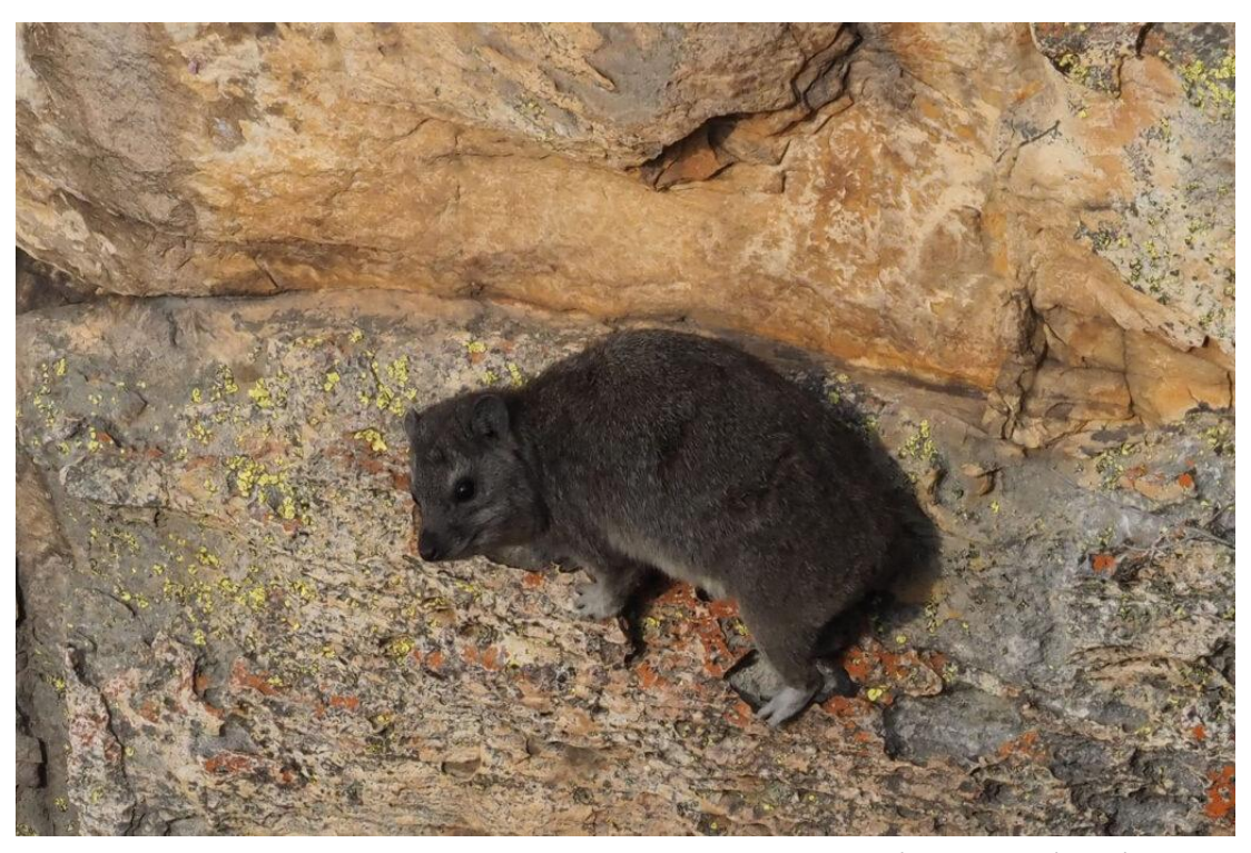
Bush Hyrax