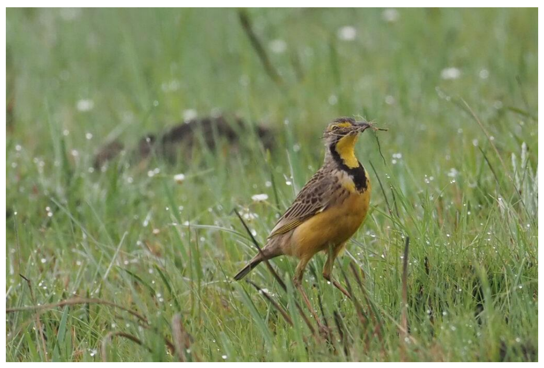
Fulleborn's Longclaw