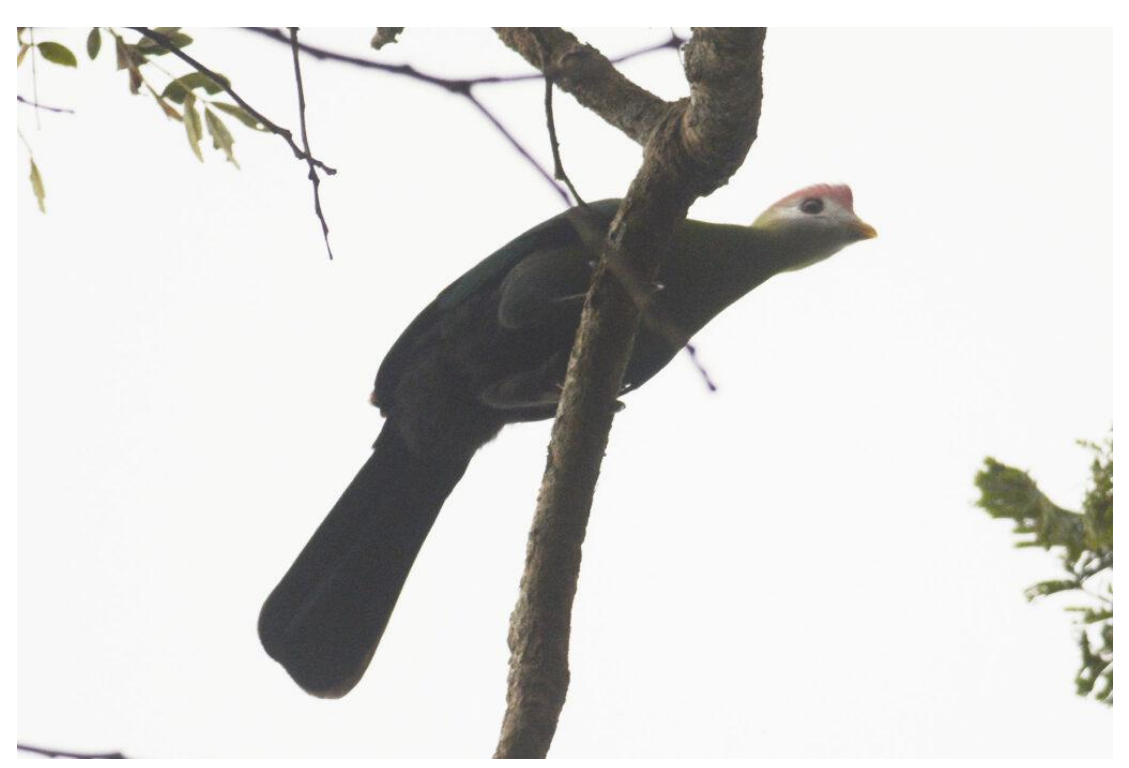
Red-crested Turaco