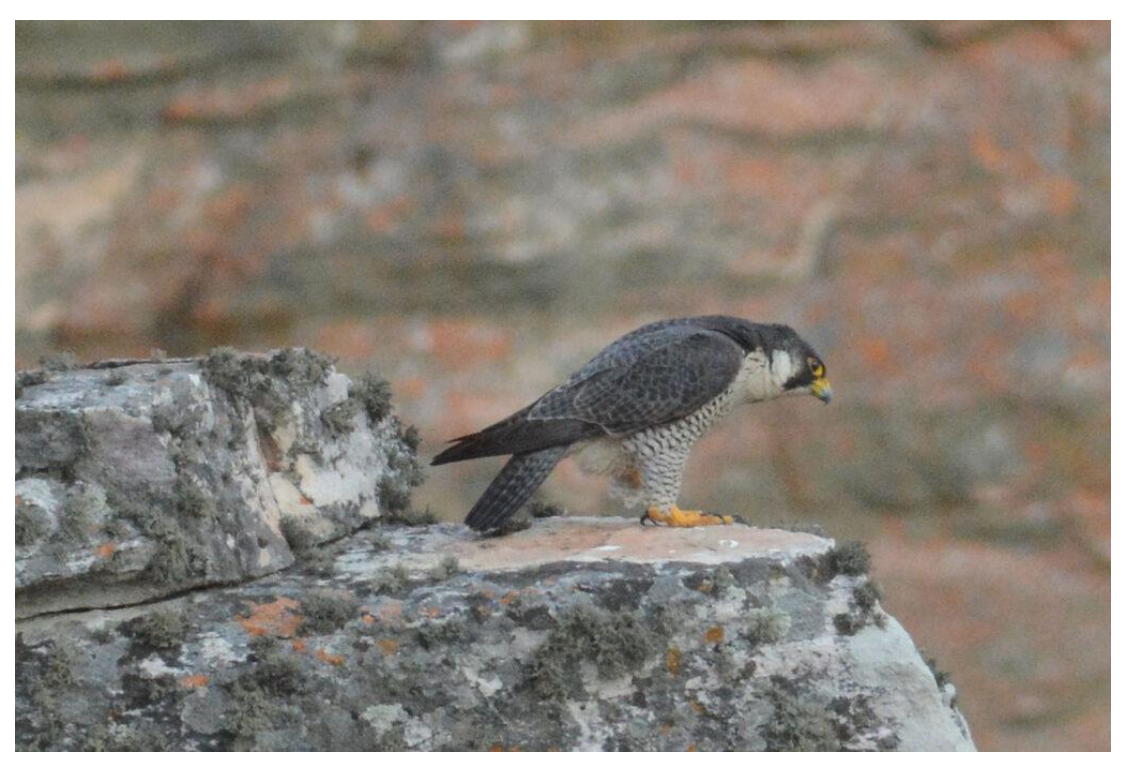
Peregrine Falcon