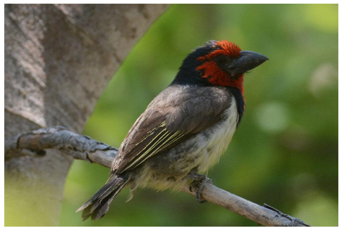
Black-collared Barbet