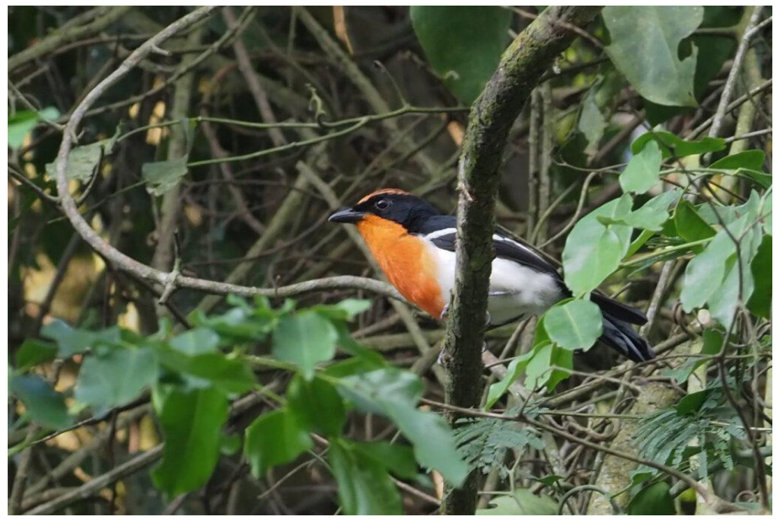
Braun's Bushshrike