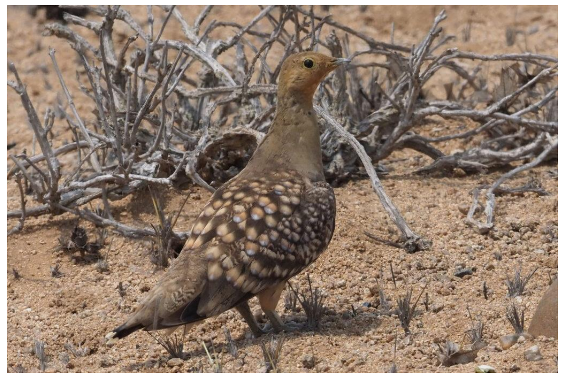
Namaqua Sandgrouse