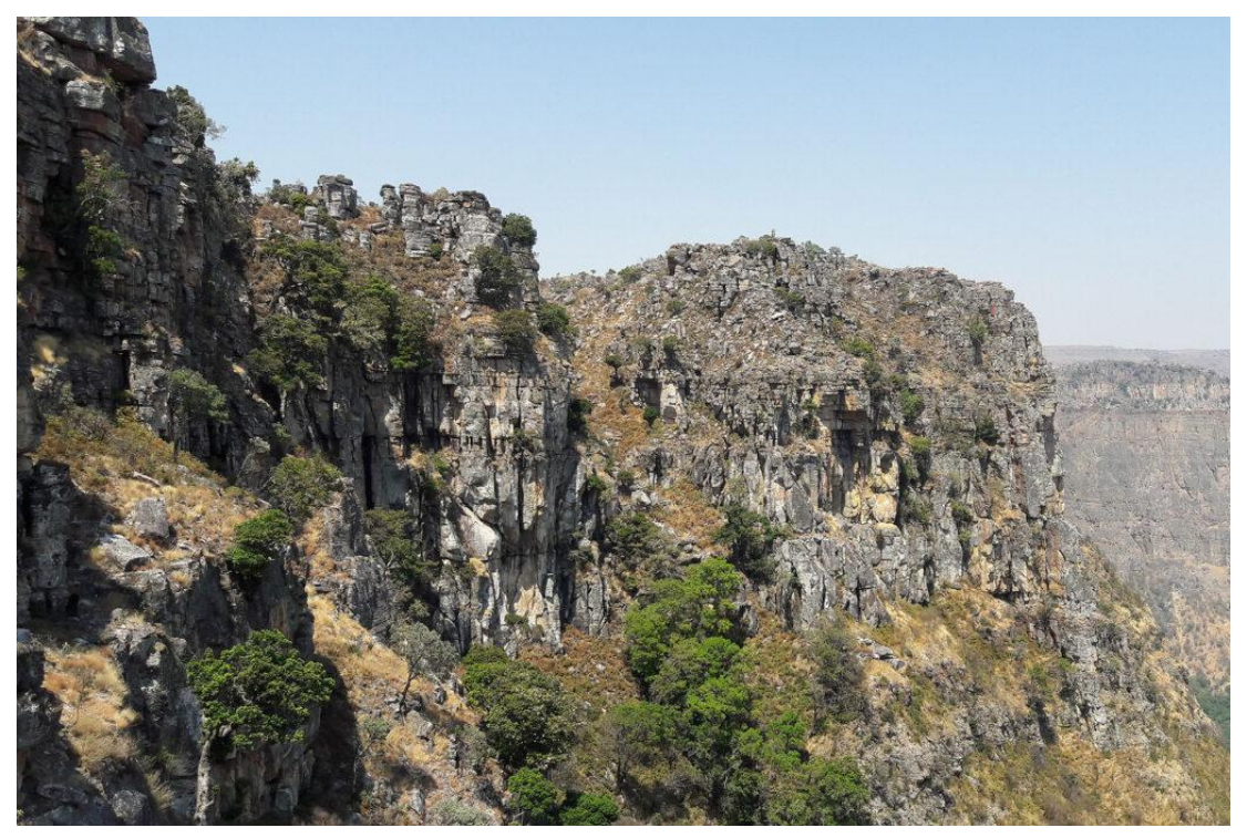
Tundavala escarpment