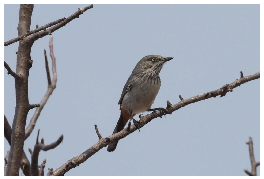
Chestnut-vented Warbler