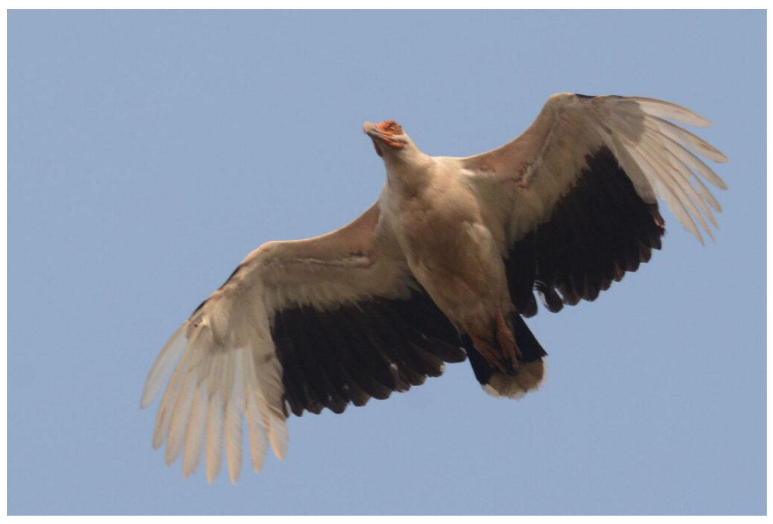
Palm-nut Vulture