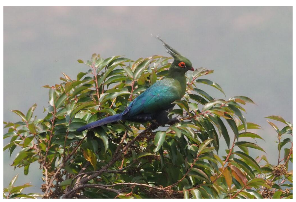
Schalow's Turaco