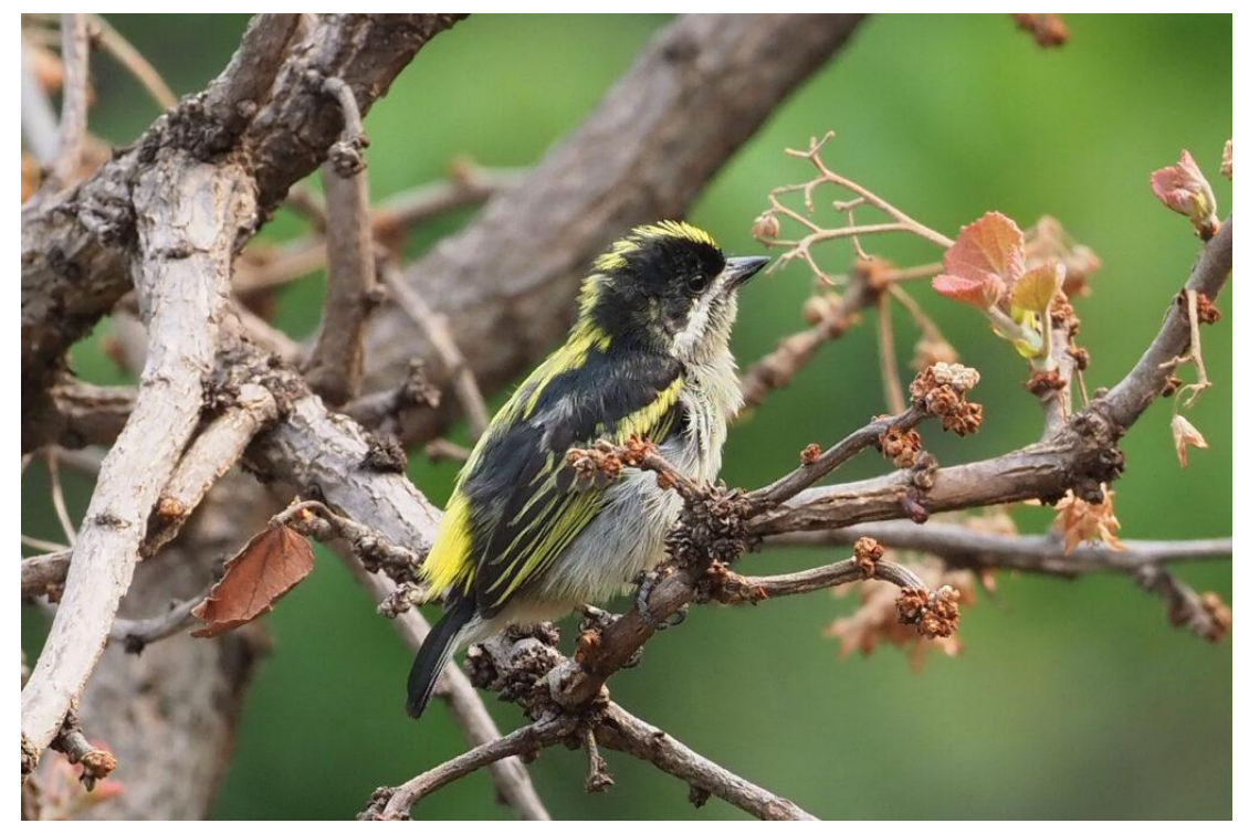
Western Green Tinkerbird