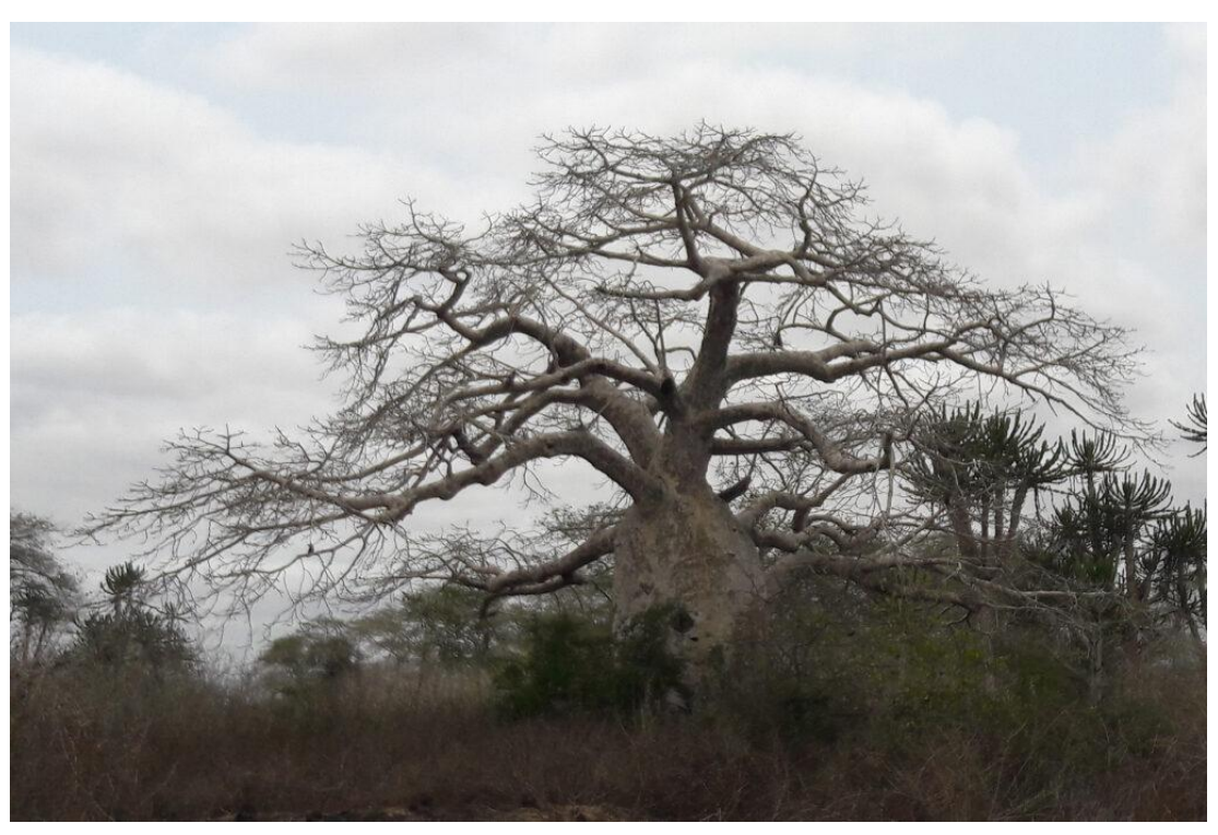
Baobab