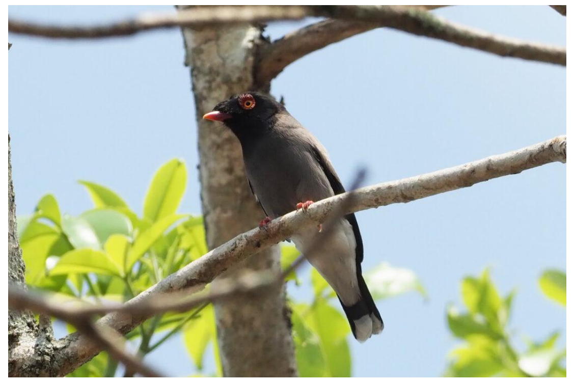
Gabela Helmetshrike