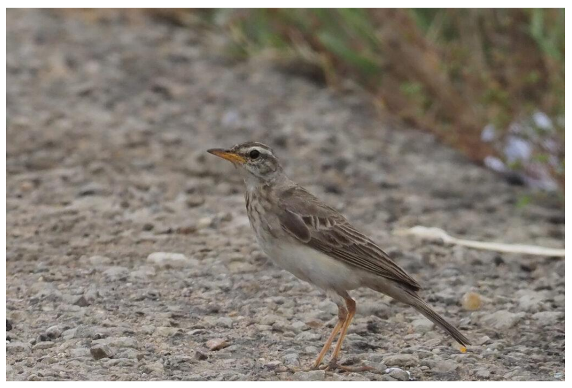
Long-legged Pipit