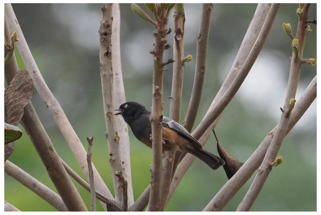
Rufous-bellied Tit