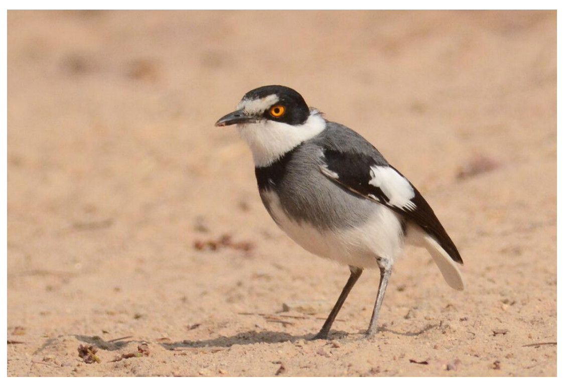
White-tailed Shrike