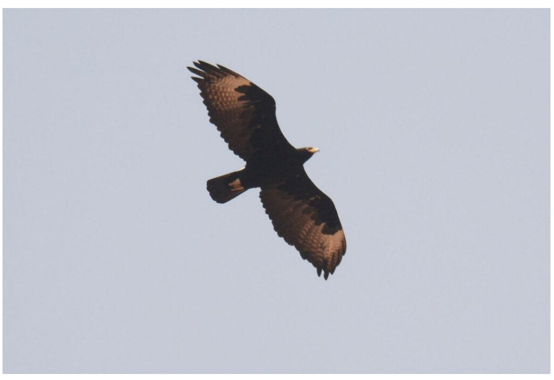
Verreaux's Eagle