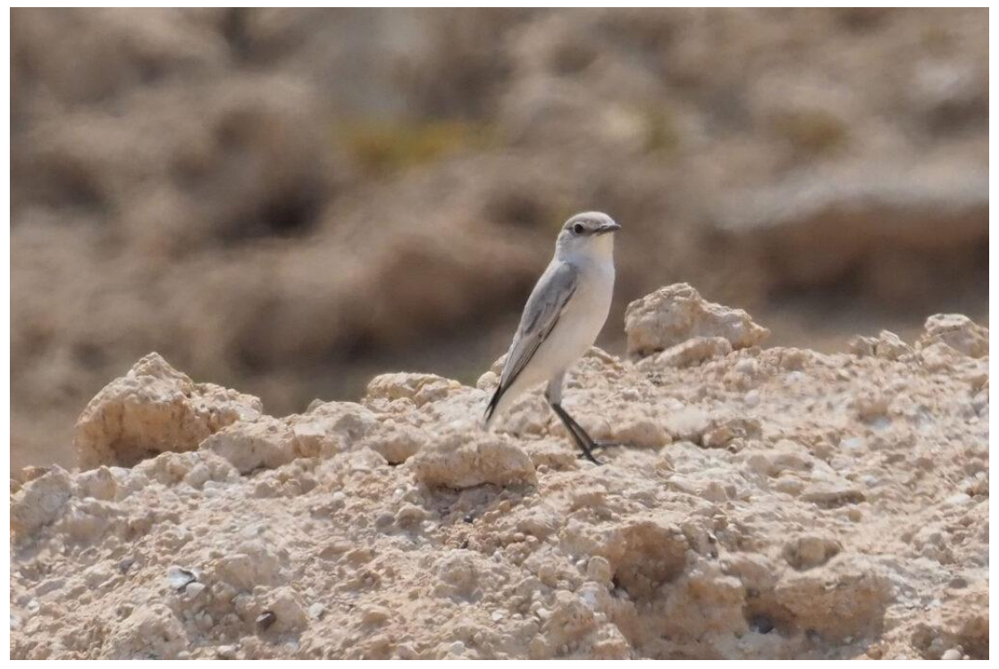
Tractrac Chat