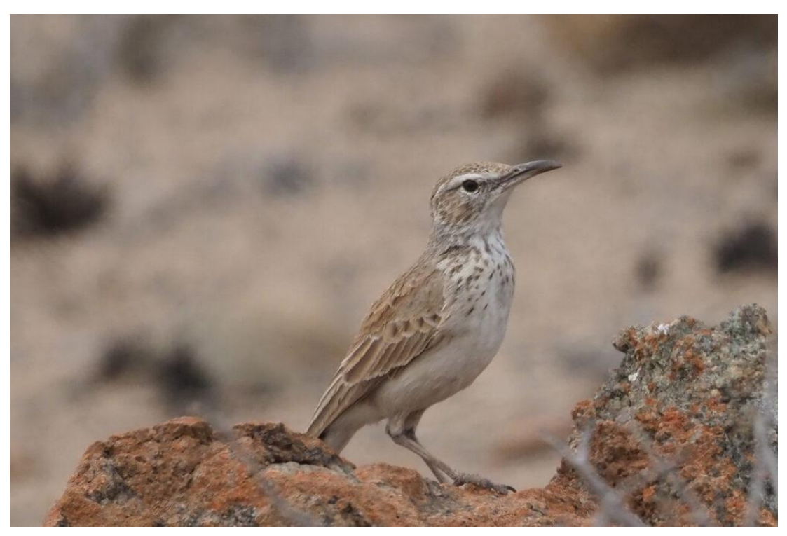
Benguela Long-billed Lark