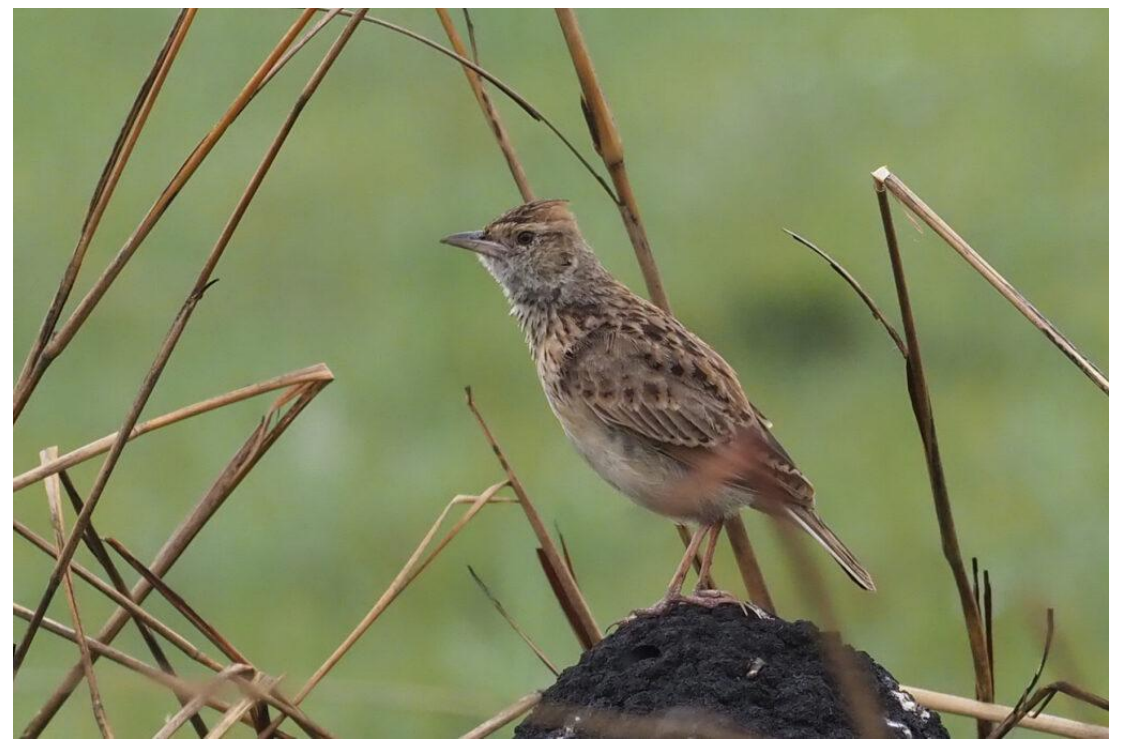
Angola Lark