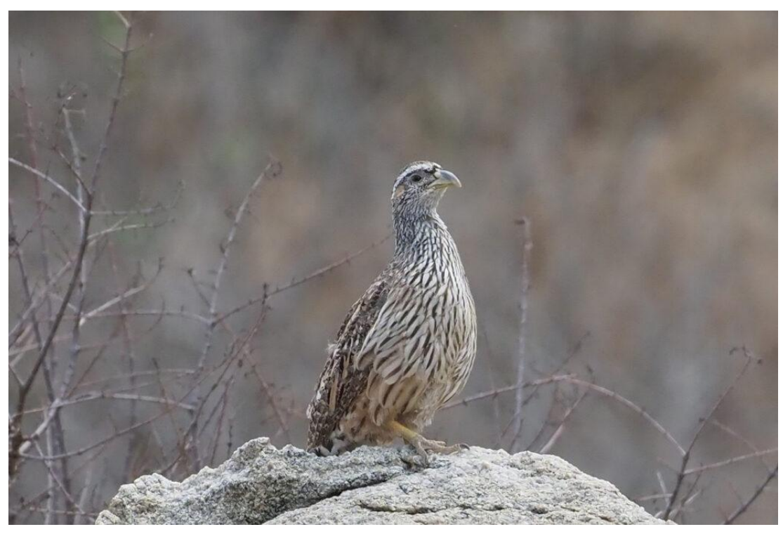
Hartlaub's Spurfowl