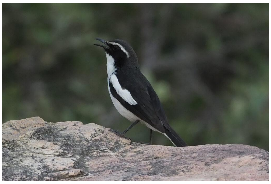
Angola Cave Chat