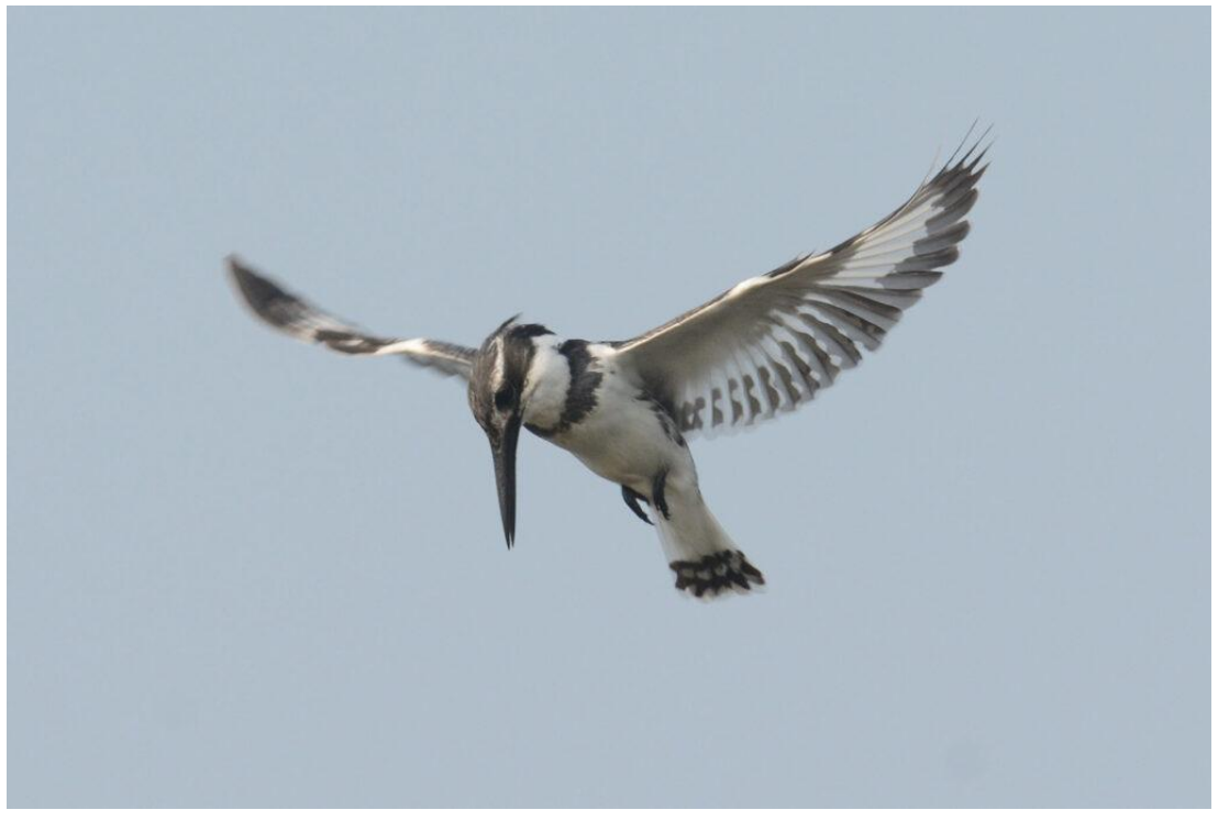
Pied Kingfisher