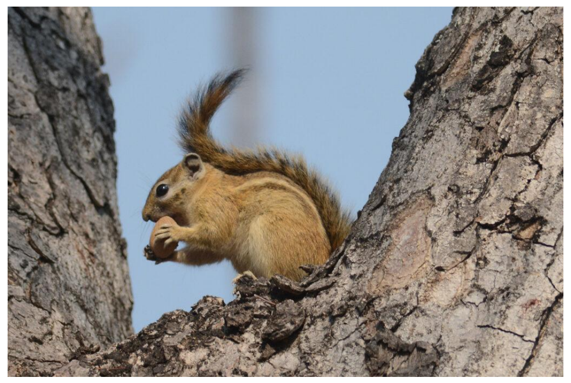
Congo Rope Squirrel