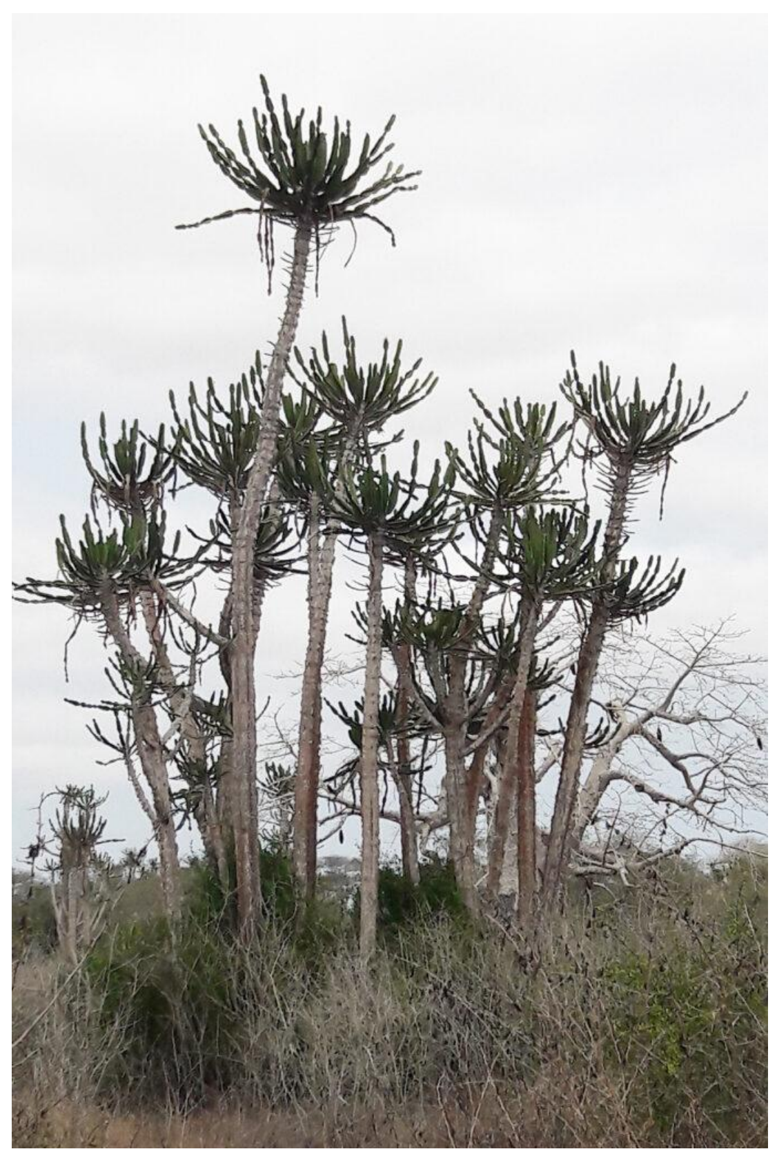
Euphorbia