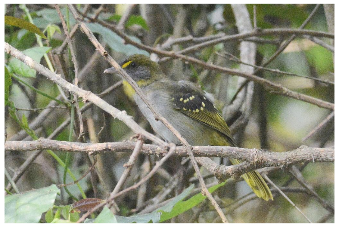
Yellow-throated Nicator