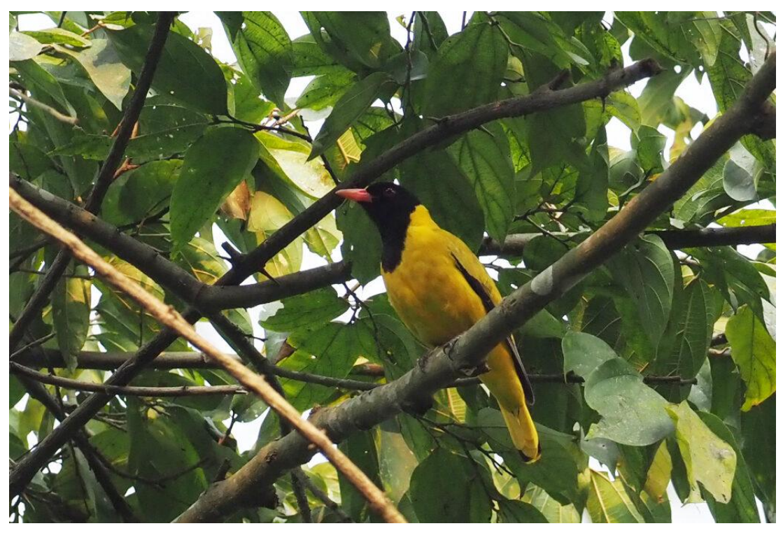
Black-winged Oriole