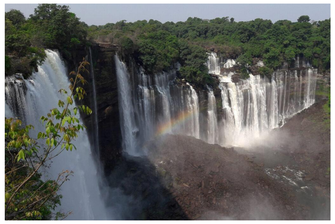
Calandula Fall