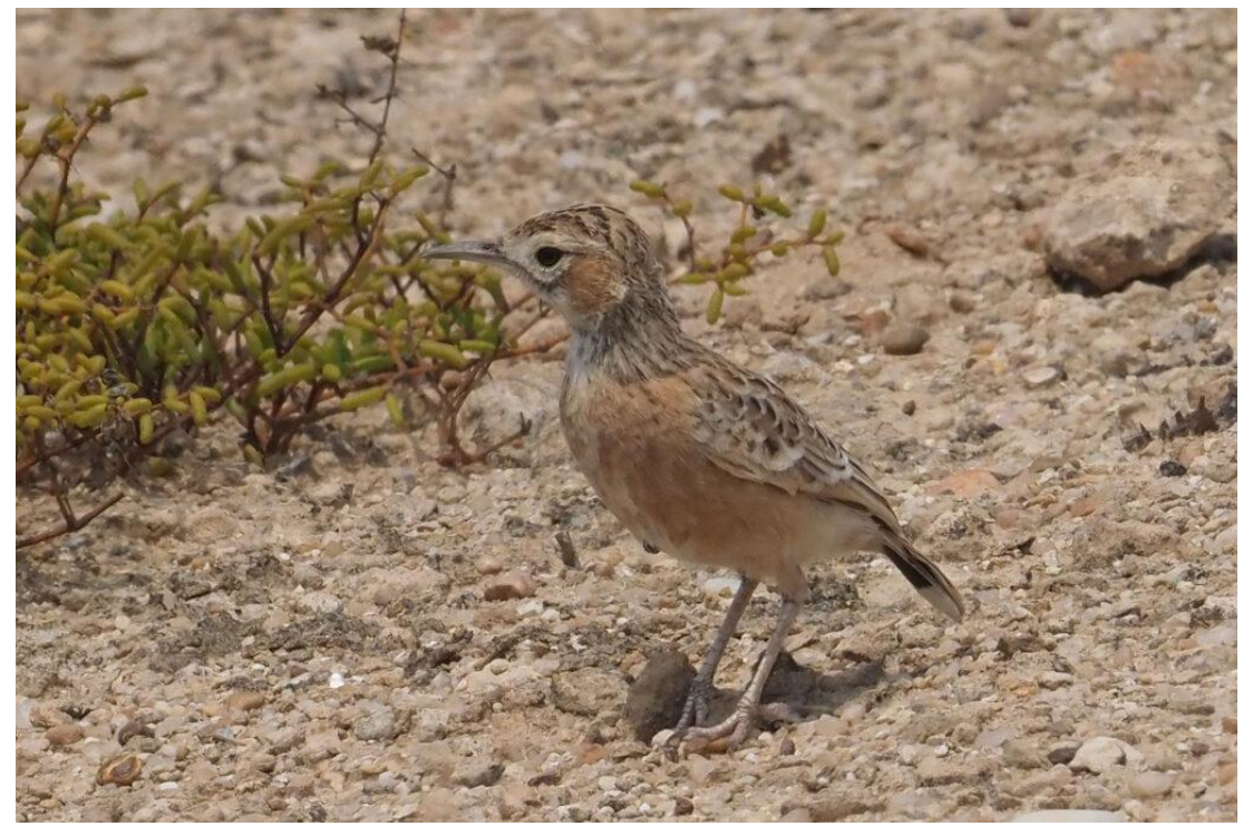
Spike-heeled Lark