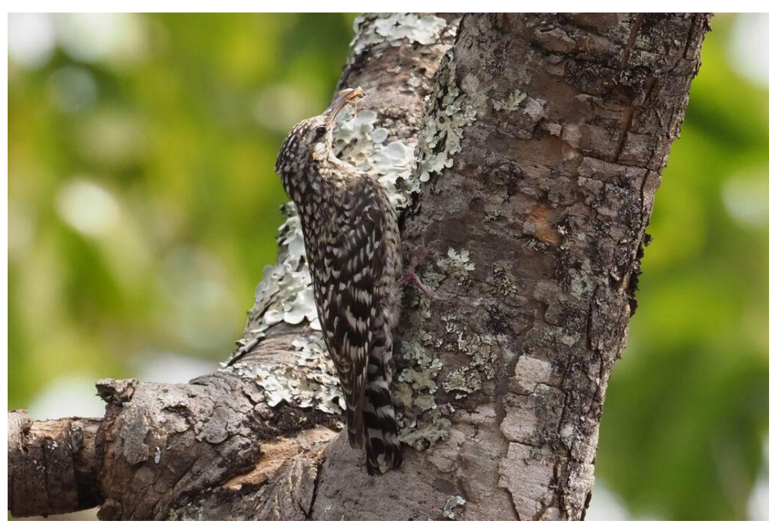
Spotted Creeper