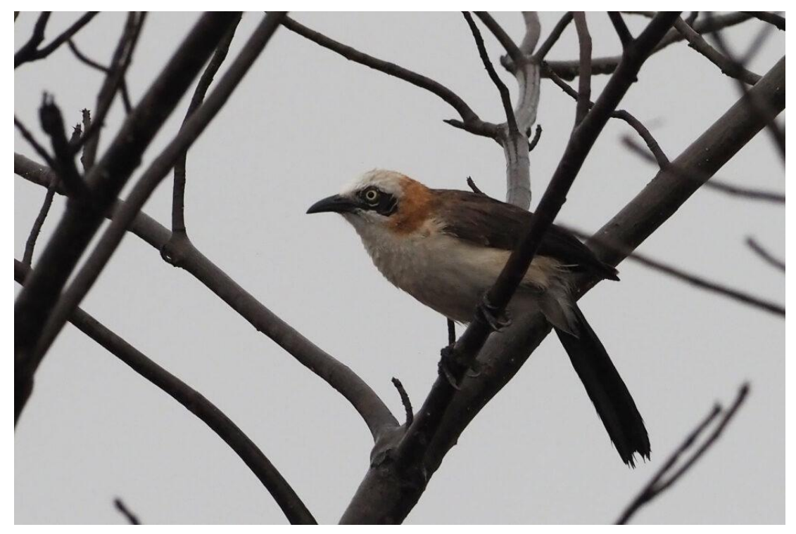
Bare-cheeked Babbler