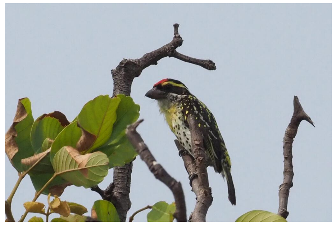
Miombo Pied Barbet