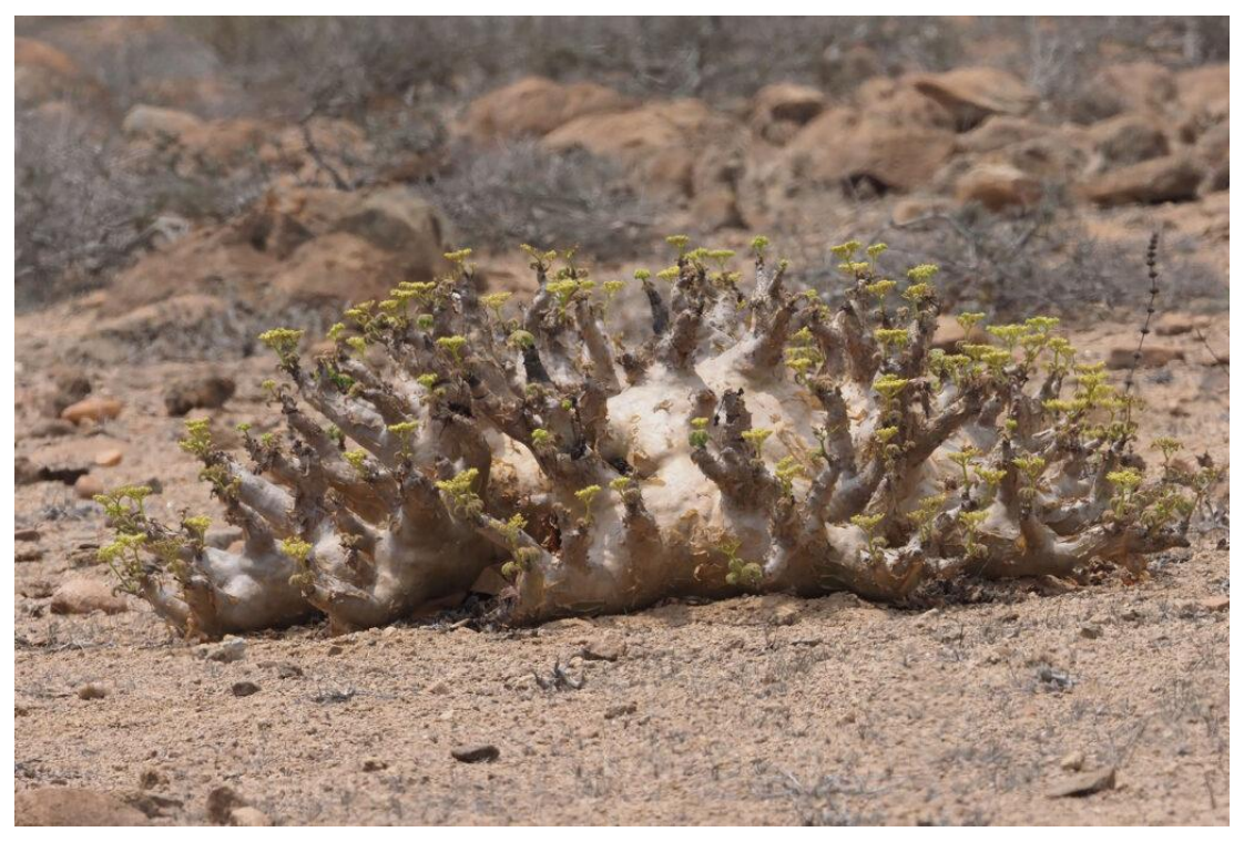
Pachypodium sp