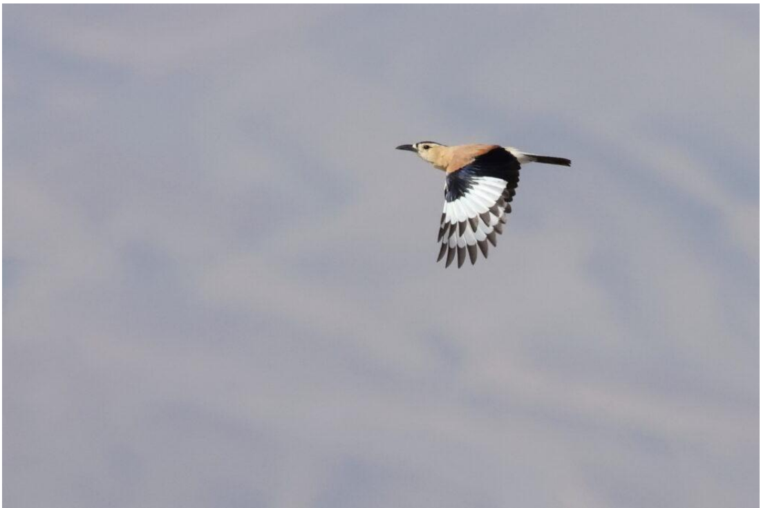
Mongolian Ground Jay