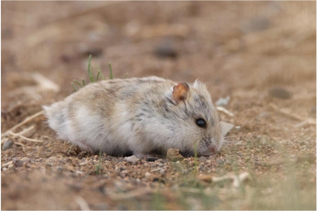
Campbell's Dwarf Hamster