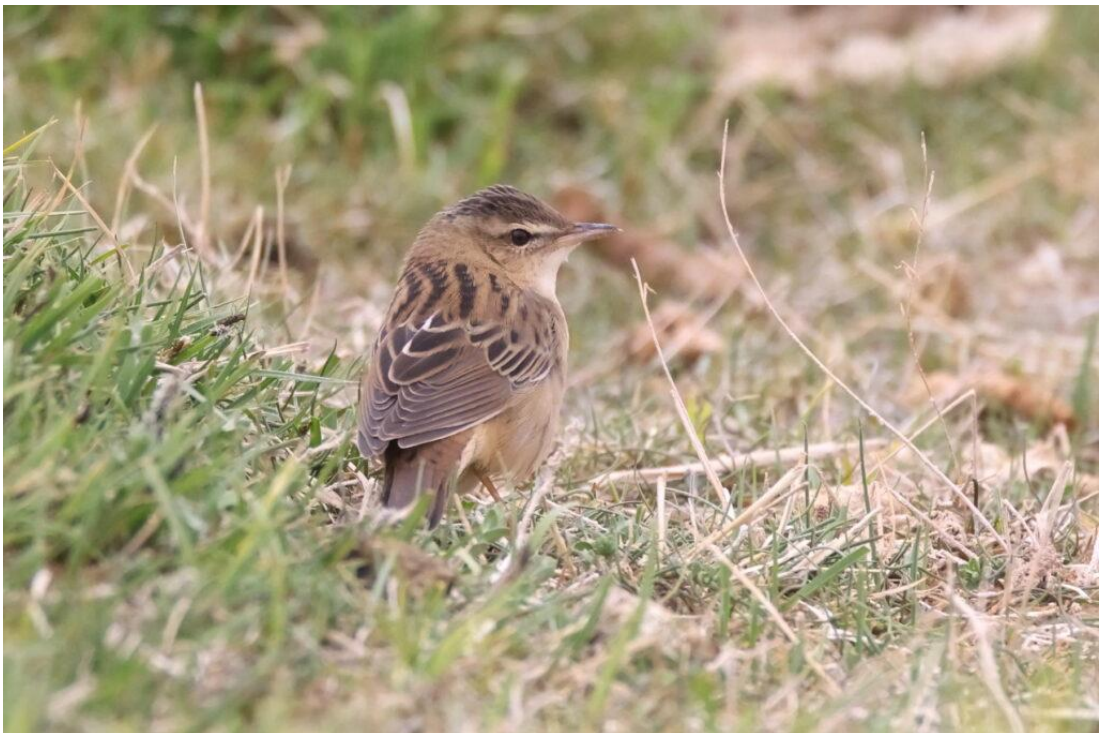
Pallas's Grasshopper Warbler