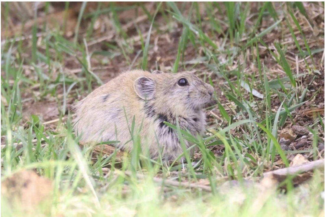
Daurian Pika