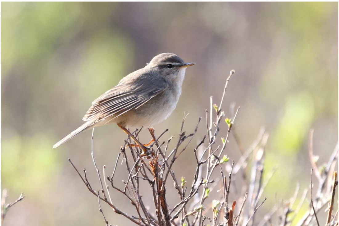
Dusky Warbler