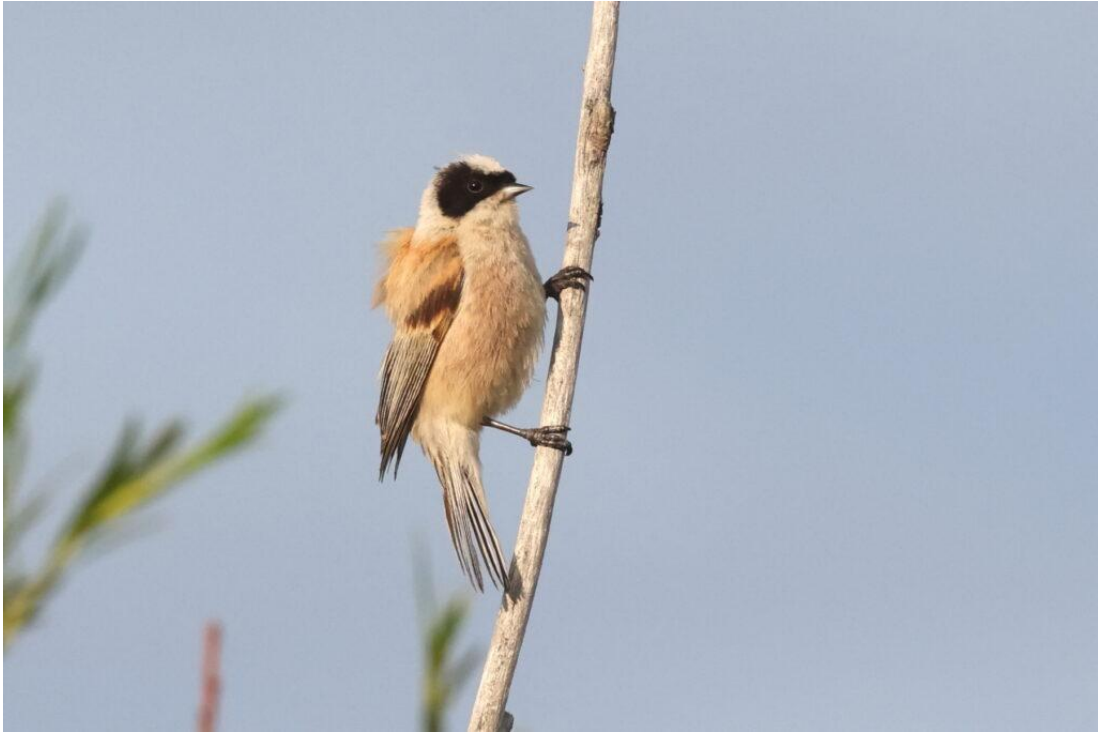
White-crowned Penduline Tit