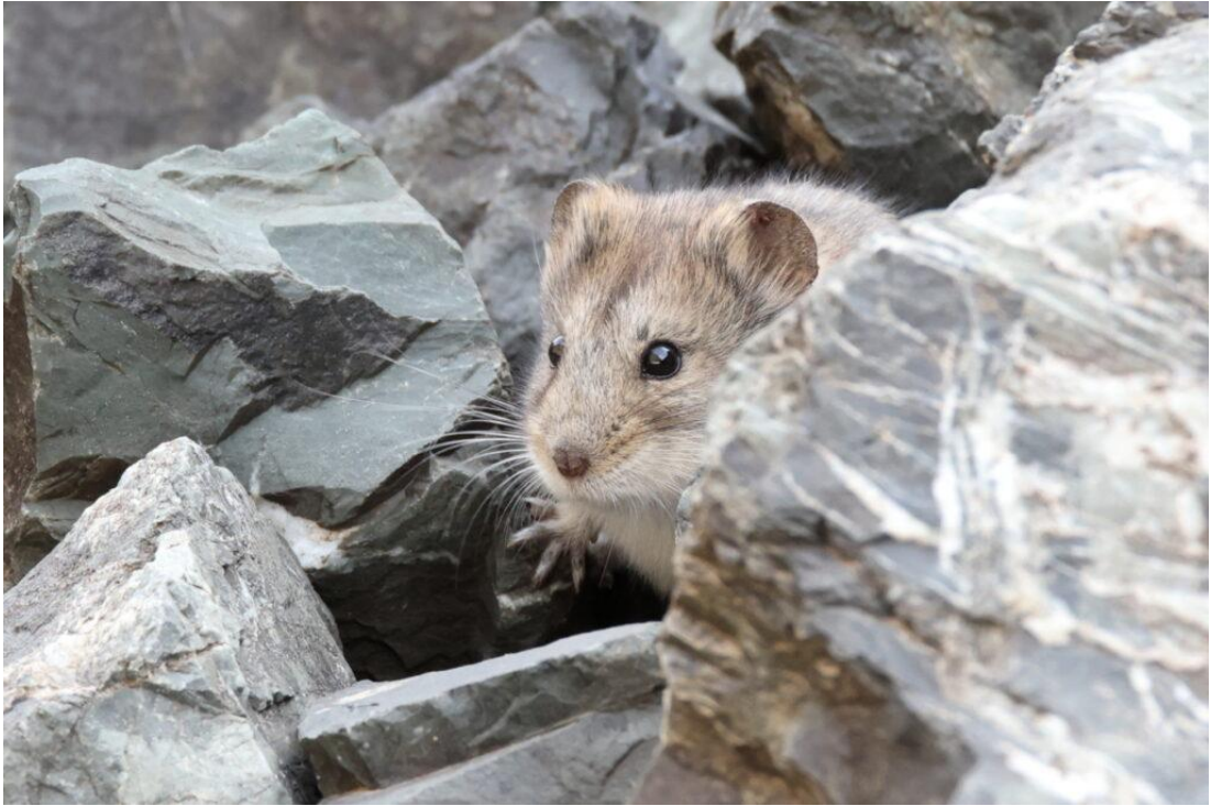
Gobi Ali Mountain Vole