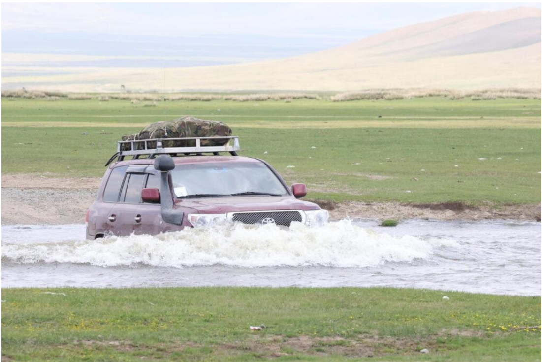
Wild Mongolia!