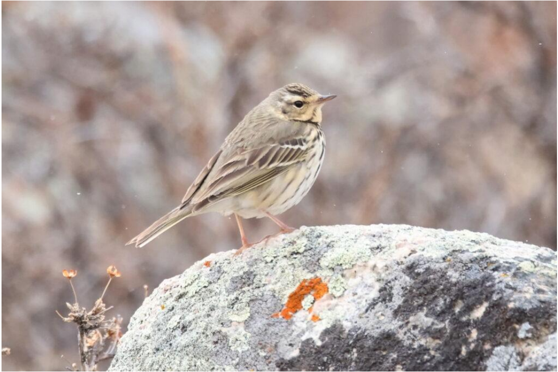
Olive-backed Pipit