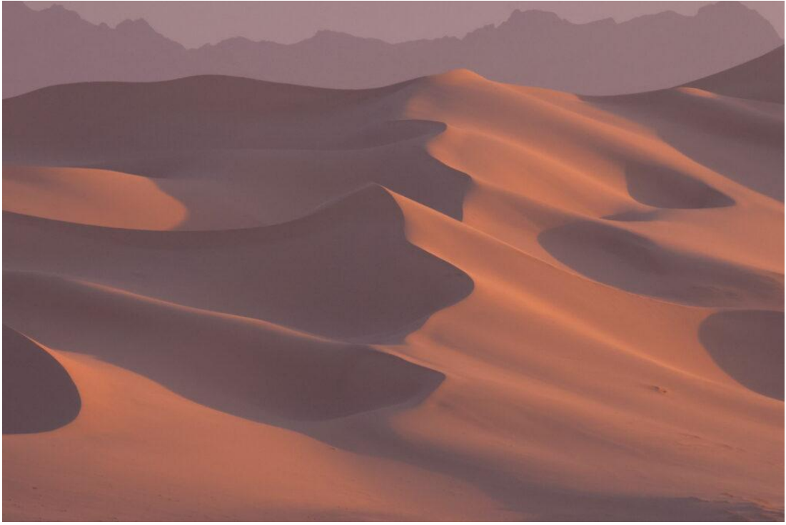
Sand dunes of the Gobi