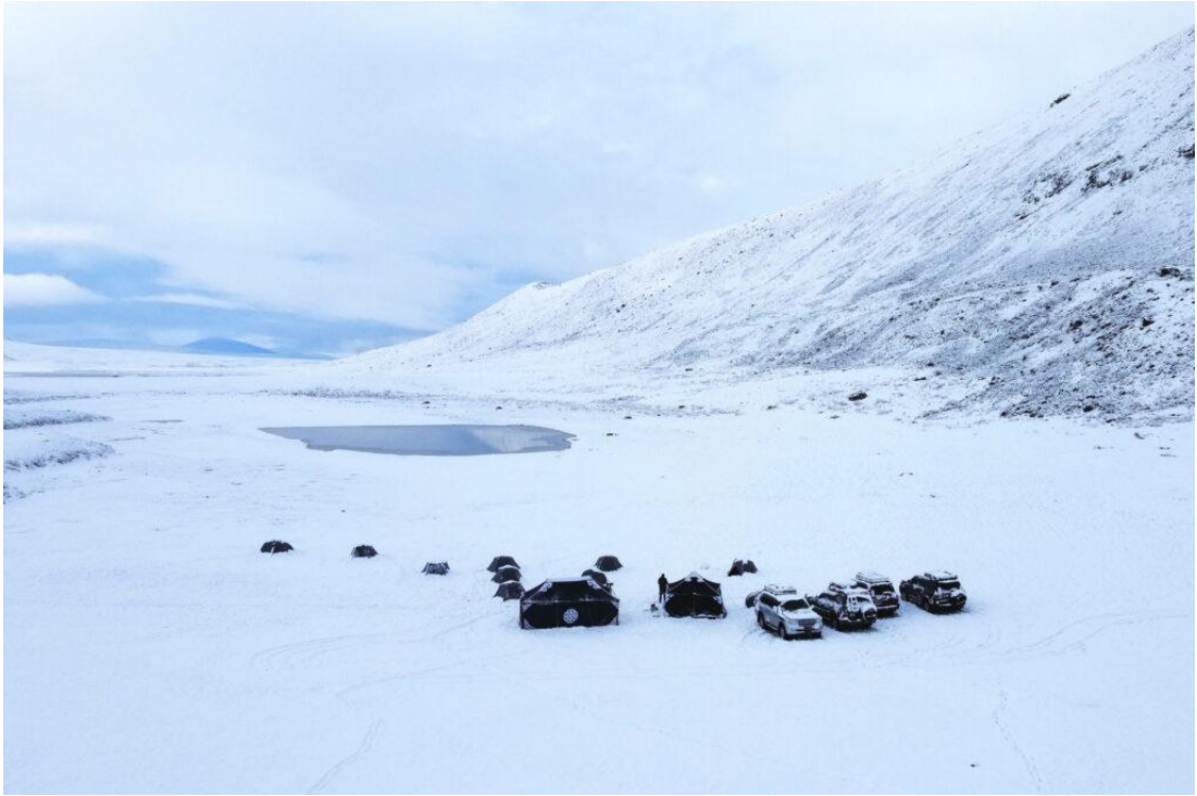
Khukh Lake in a snowy morning