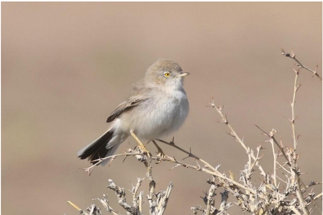
Asian Desert Warbler