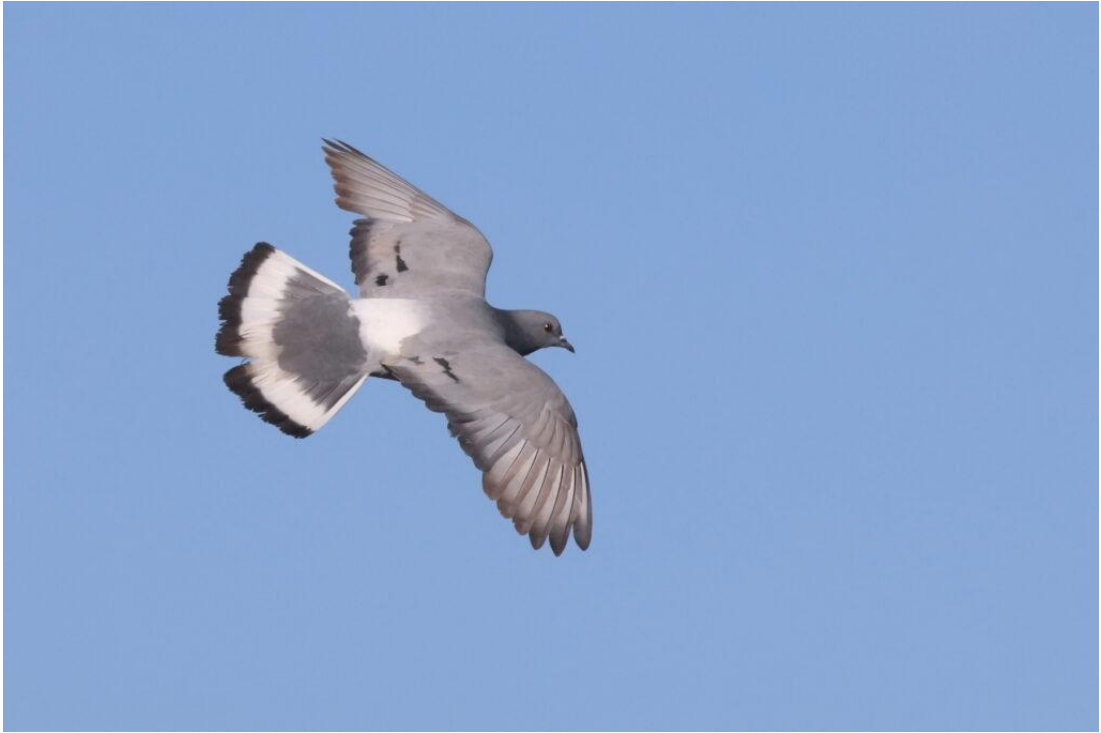
Hill Pigeon