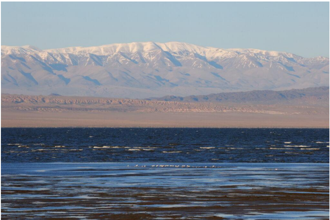
Boontsagaan Nuur