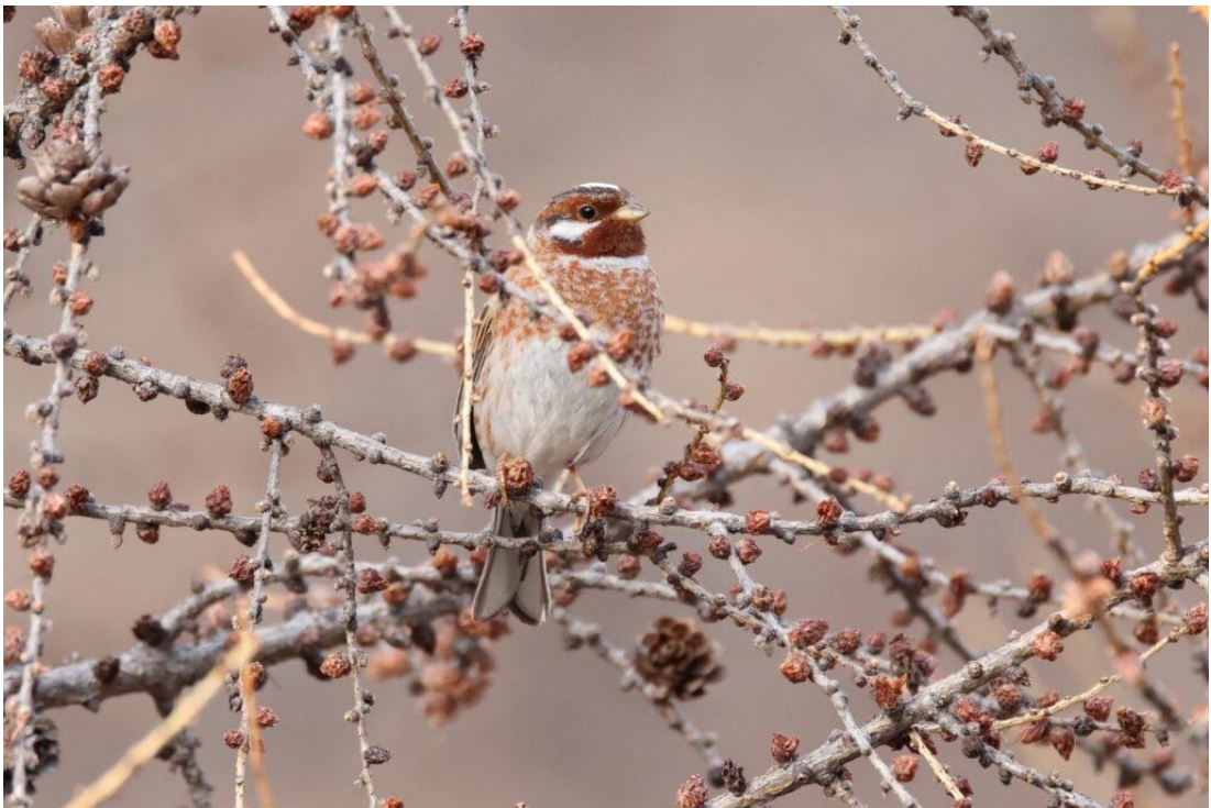
Pine Bunting