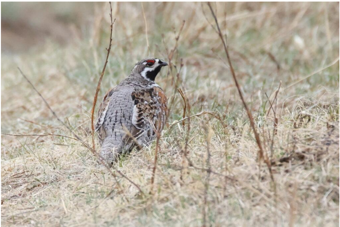
Hazel Grouse