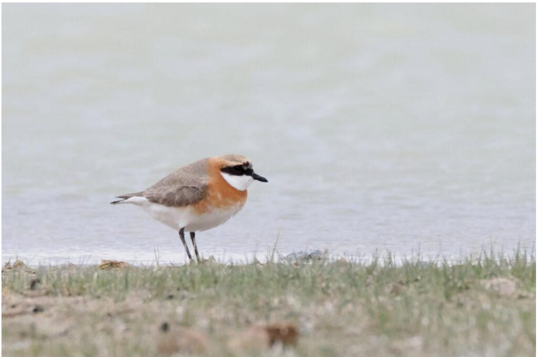
'Siberian' Lesser Sand Plover