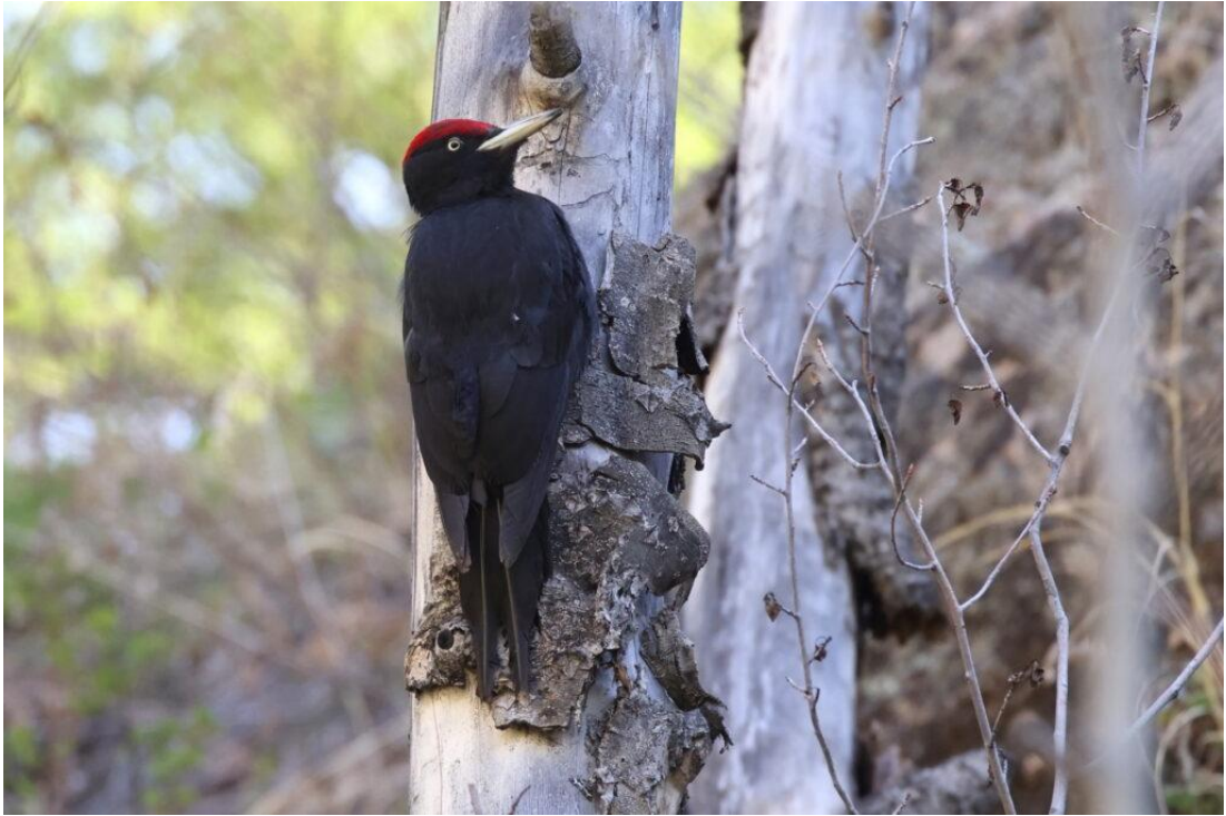
Black Woodpecker