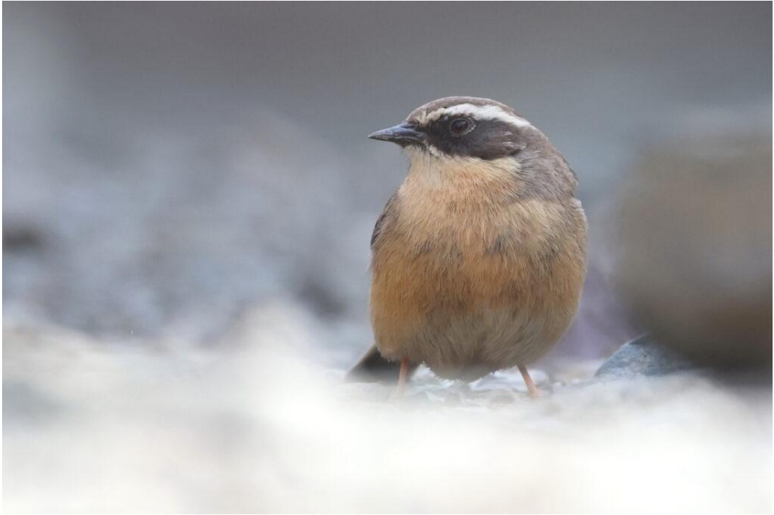
Brown Accentor