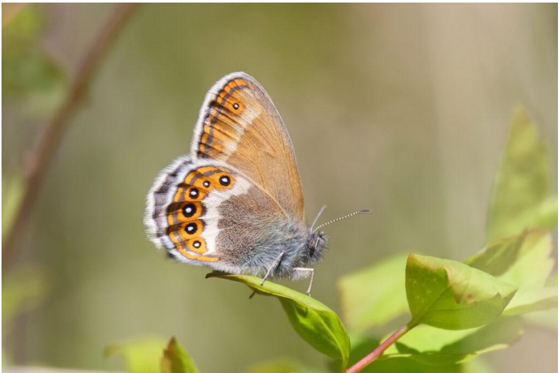
Scarce Heath (perseis race)