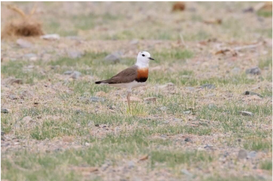
Oriental Plover