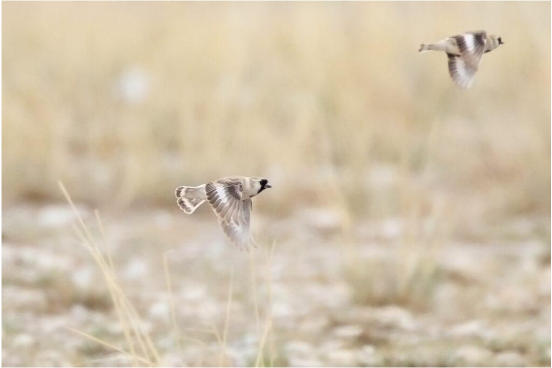
Pere David's Snowfinch