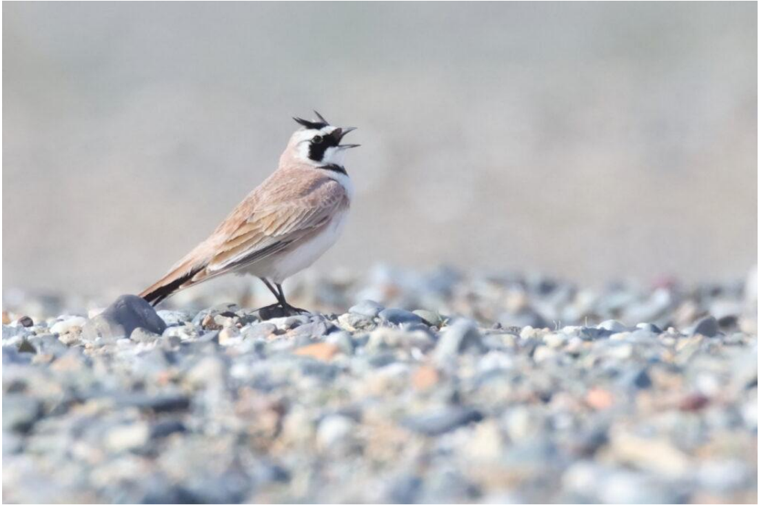
Brandt's Horned Lark