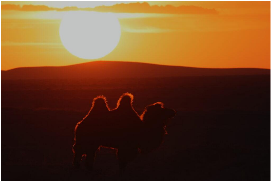
Camel in the Gobi sunset