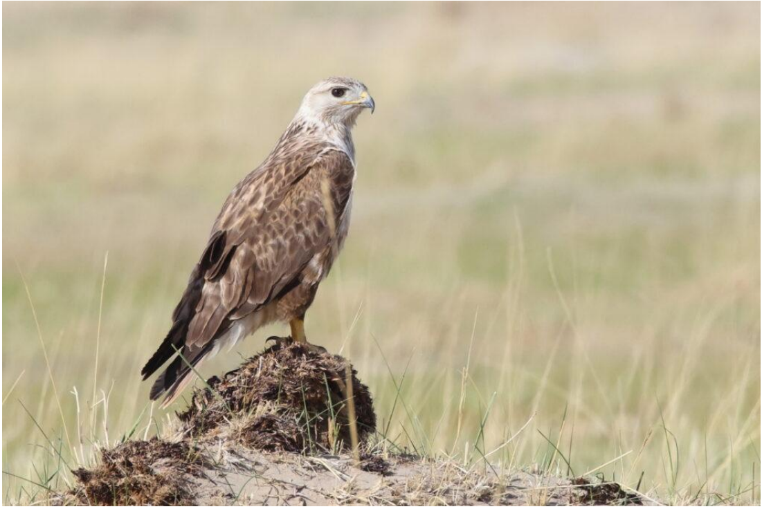
Upland Buzzard