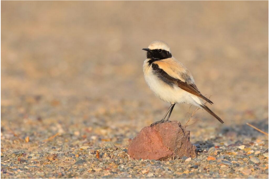
Desert Wheatear