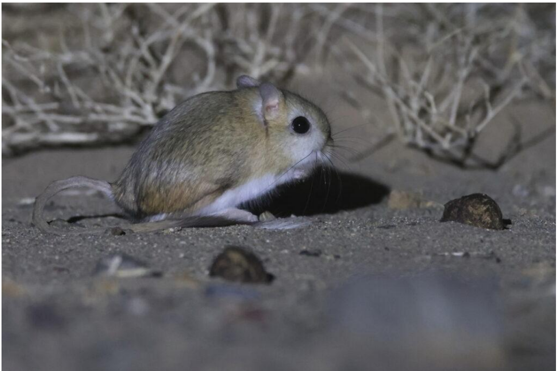
Three-toed Jerboa