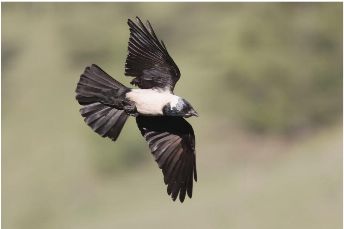
Daurian Jackdaw