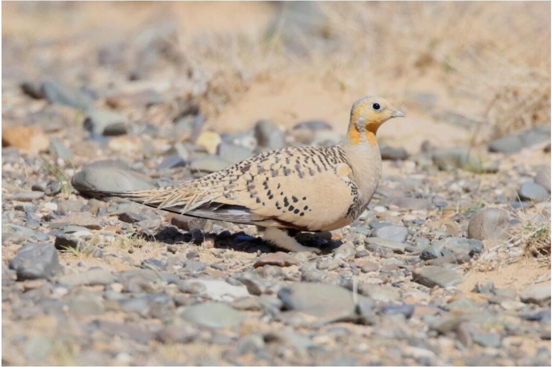
Pallas's Sandgrouse