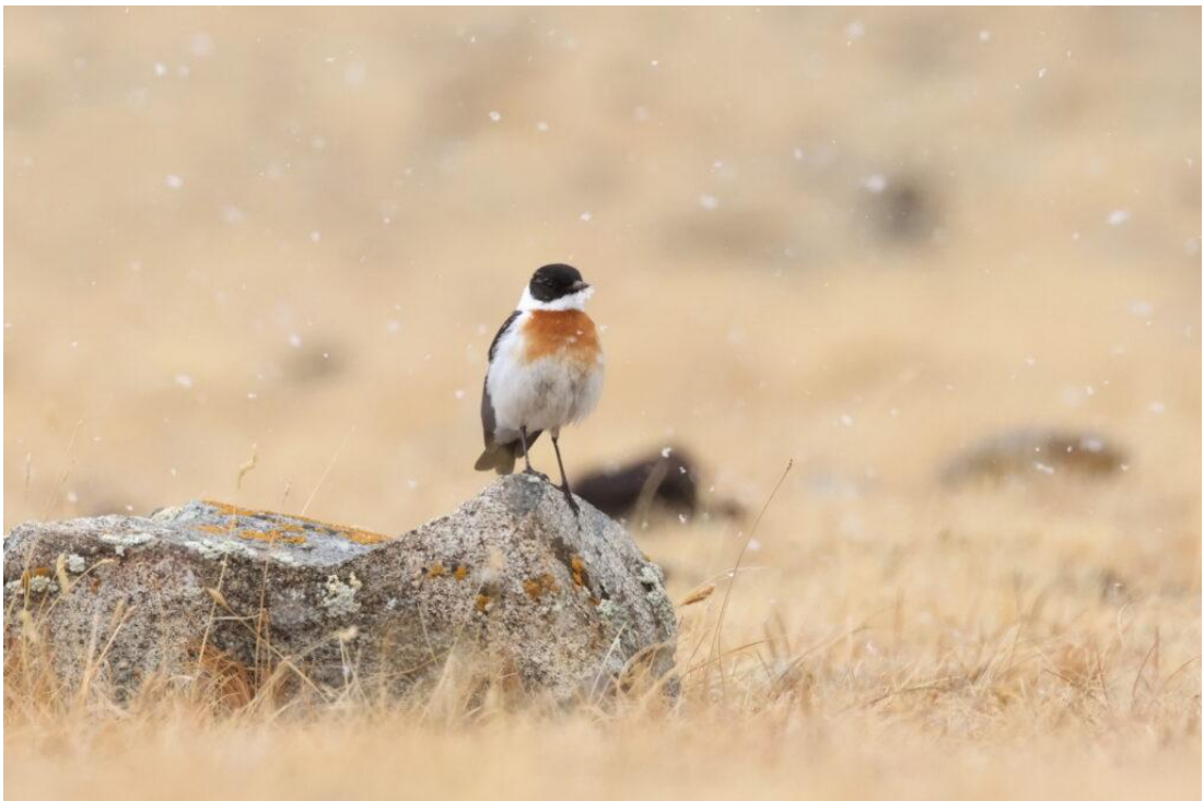
White-throated Bush Chat