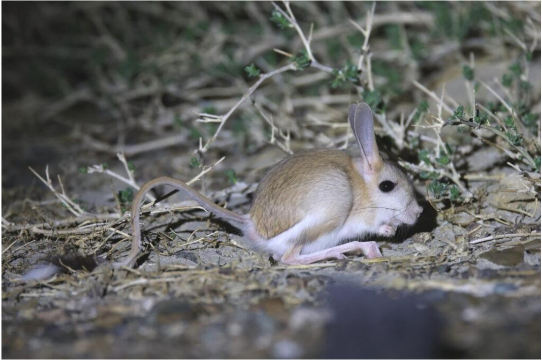
Siberian Jerboa