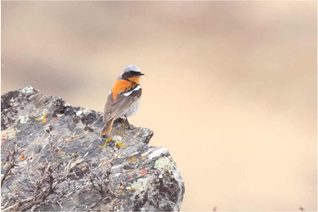
Evermann's Redstart