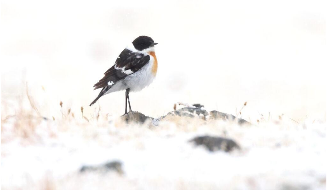
White-throated Bush Chat