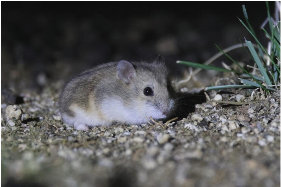
Campbell's Dwarf Hamster