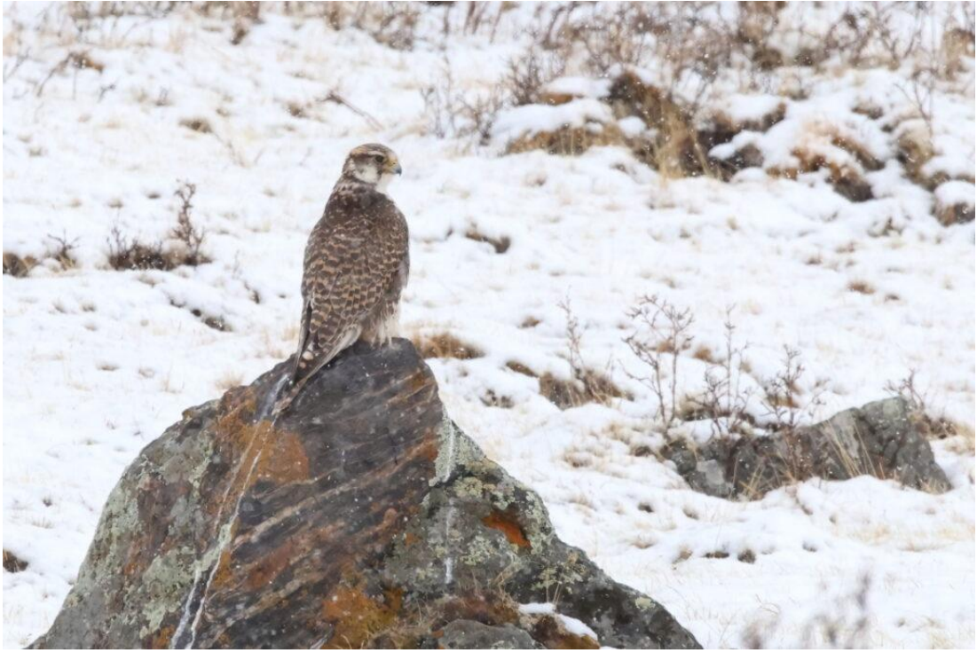
Saker Falcon