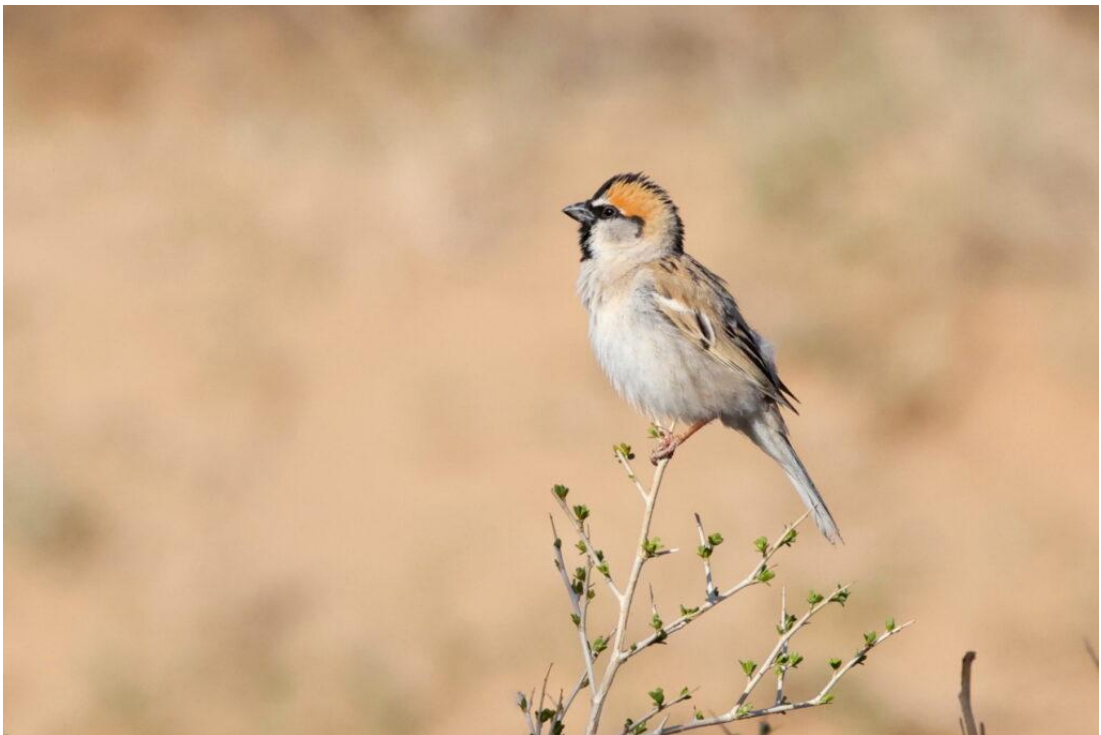
Saxaul Sparrow