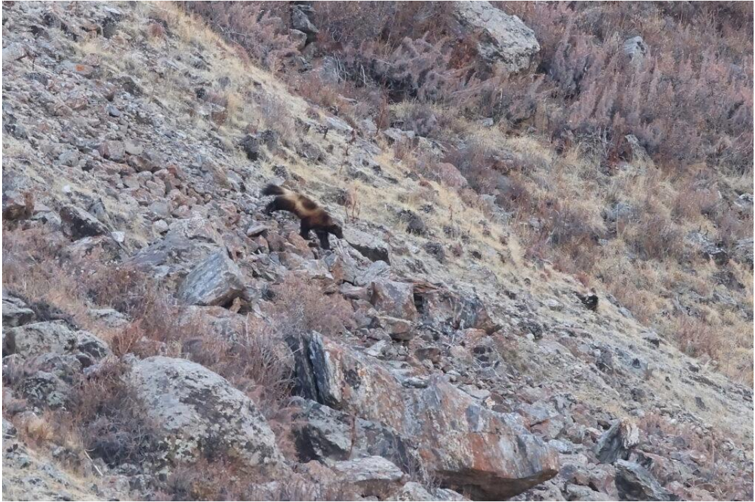
Wolverine (image by János Oláh)