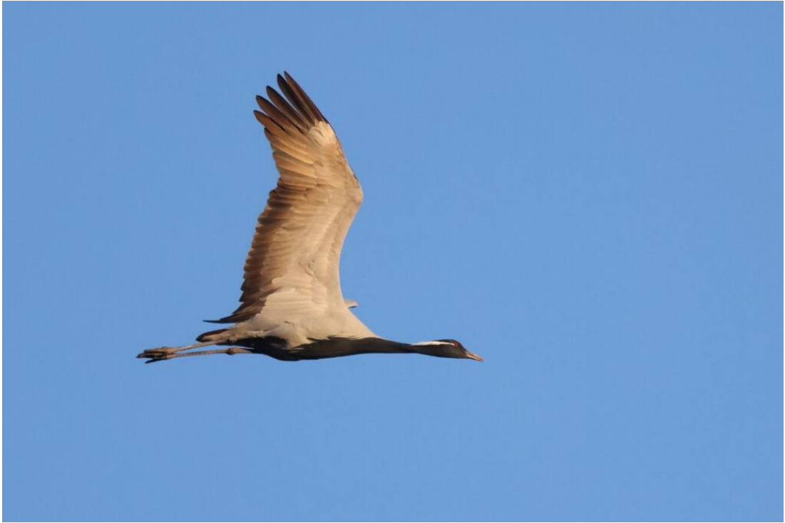
Demoiselle Crane