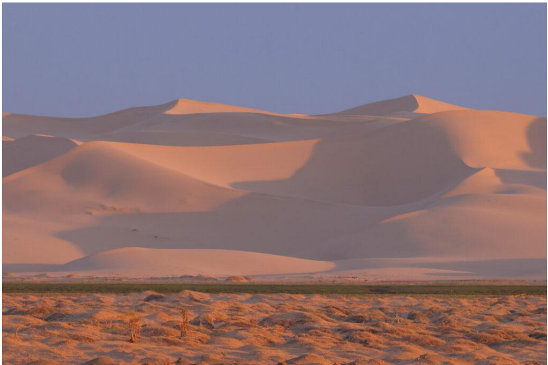
Khongorin Els