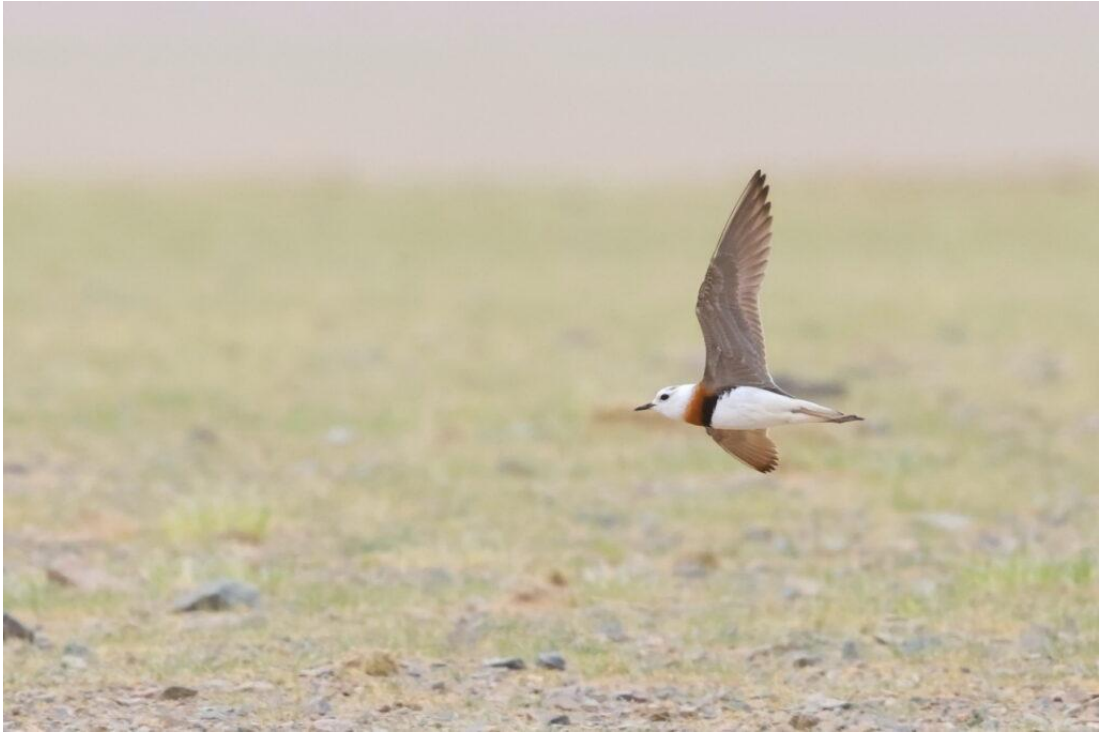
Oriental Plover