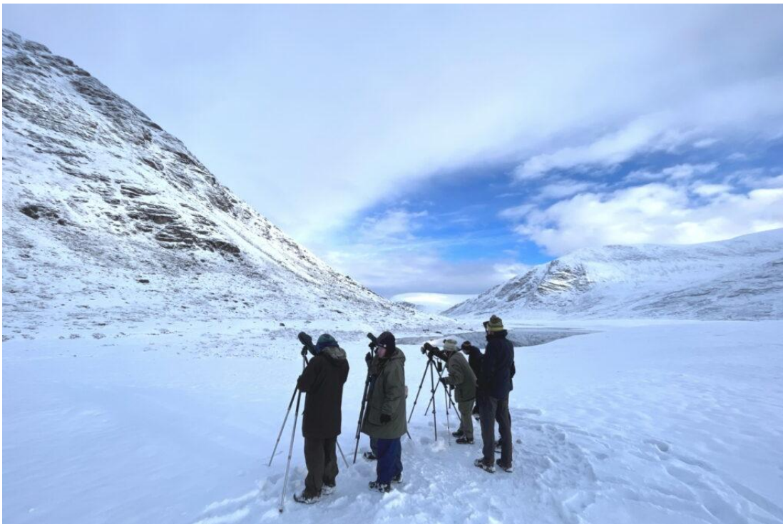
Watching Altai Snowcocks