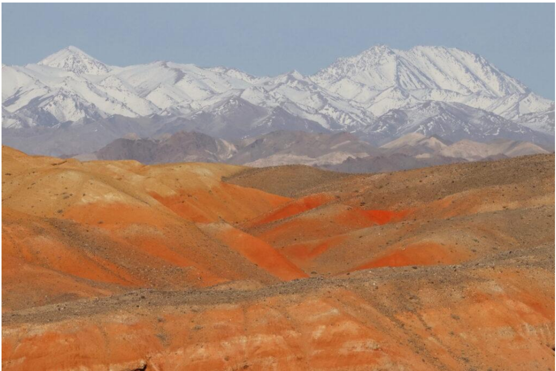
Bond Mountain