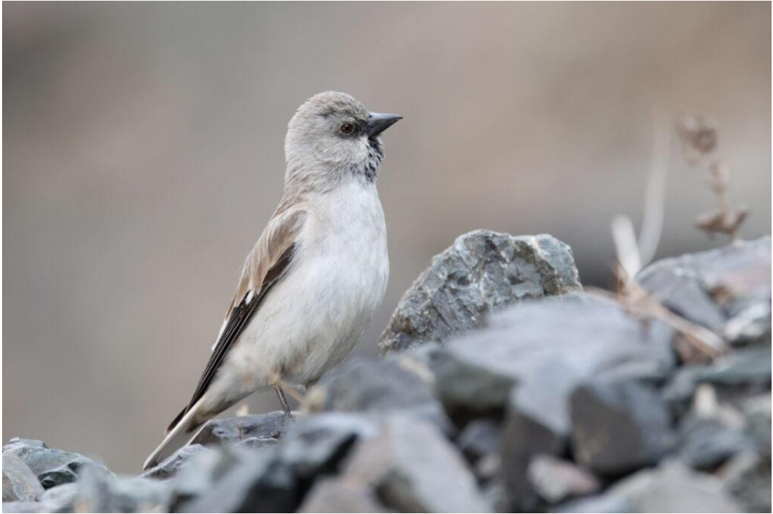
White-winged Snowfinch