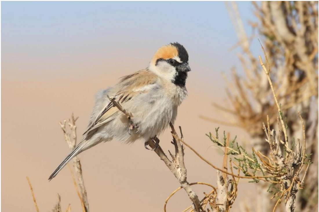
Saxaul Sparrow