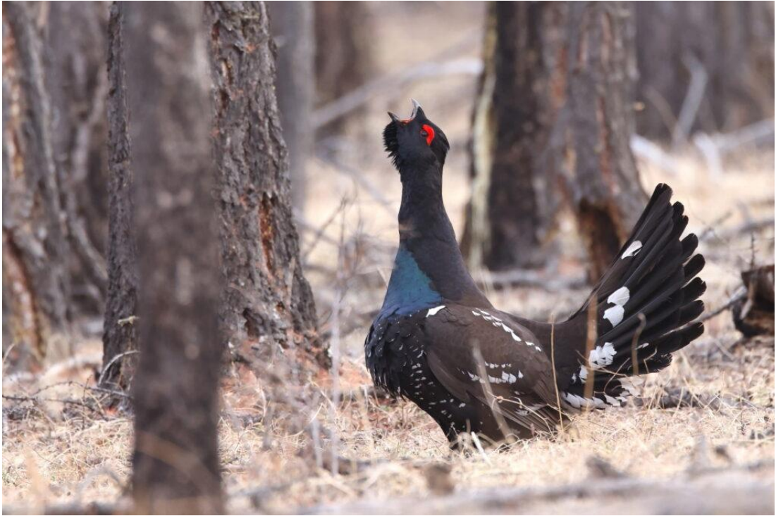
Black-billed Capercaillie