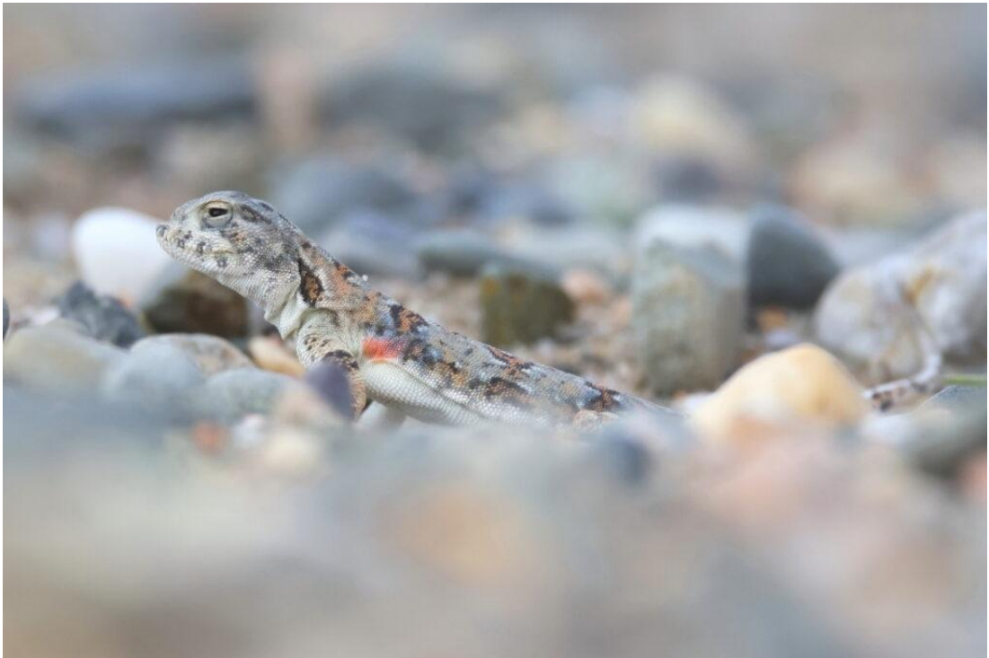
Toed-headed Agama