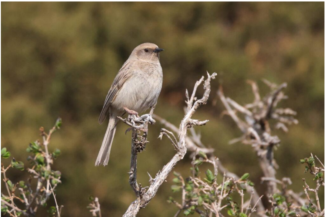
Mongolian or Kozlov's Accentor