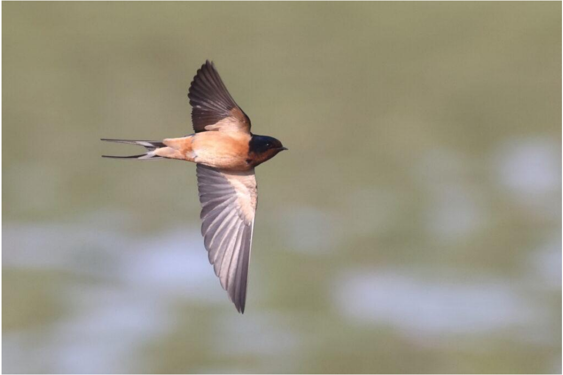
Barn Swallow tytleri race