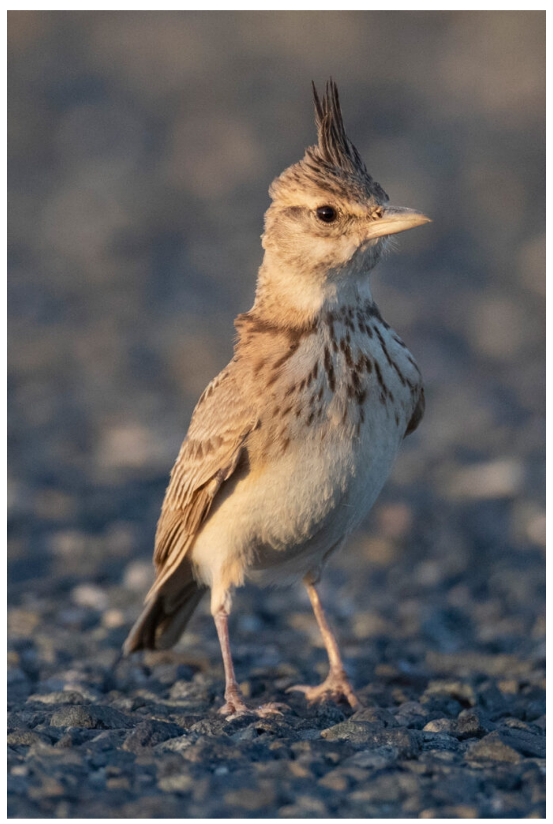
Maghreb Lark