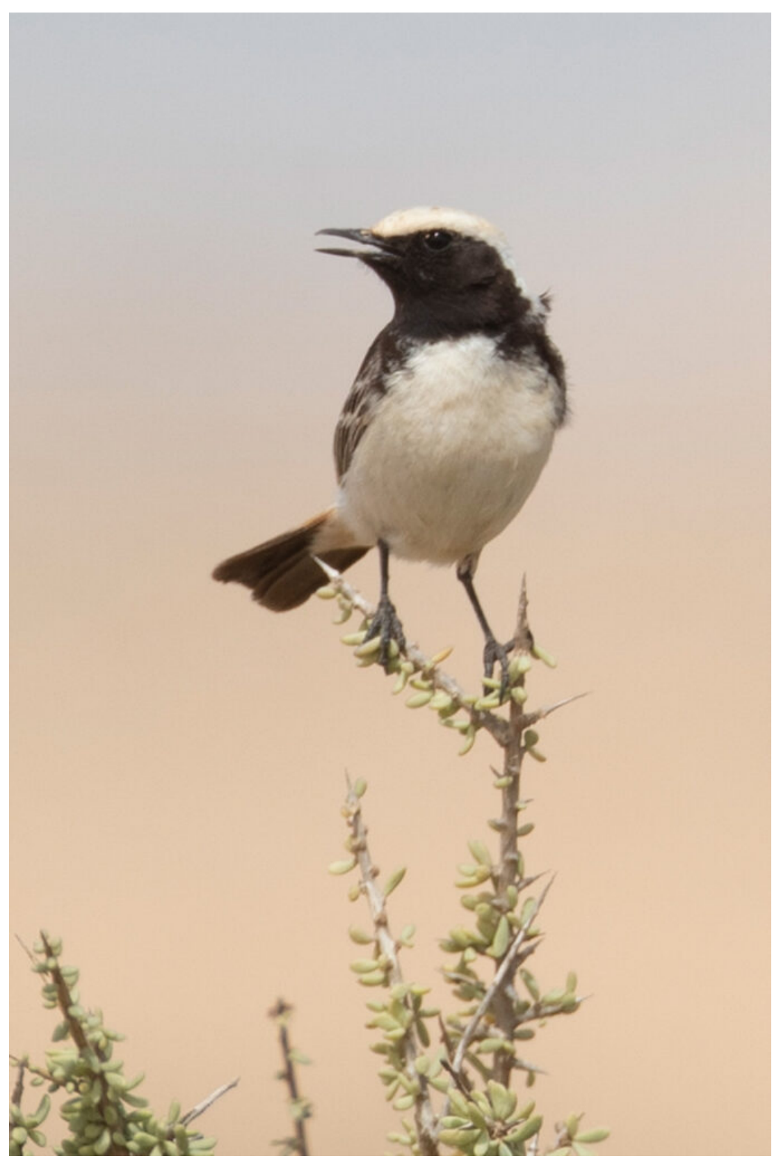
Red-rumped Wheatear