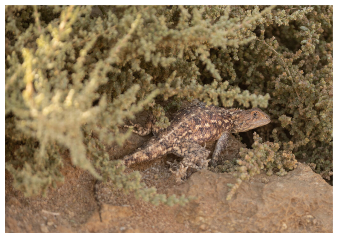
Agama imperealis/bibronii