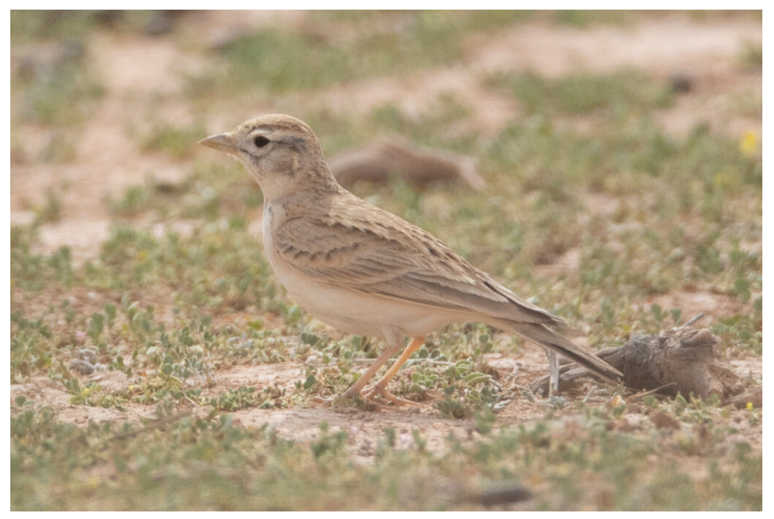
Greater Short-toed Lark