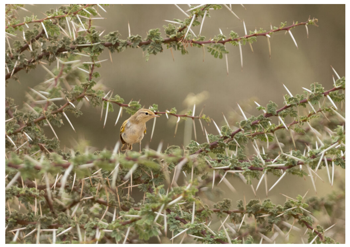
Western Bonelli's Warbler