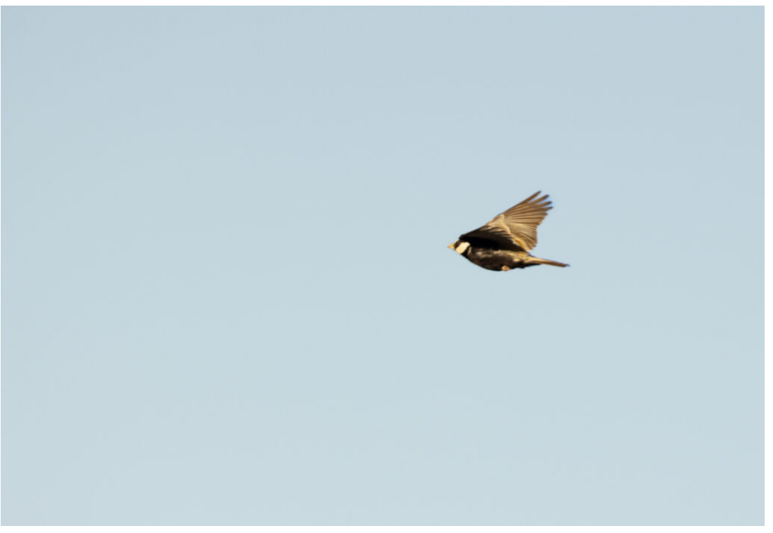
Black-crowned Sparrow-Lark