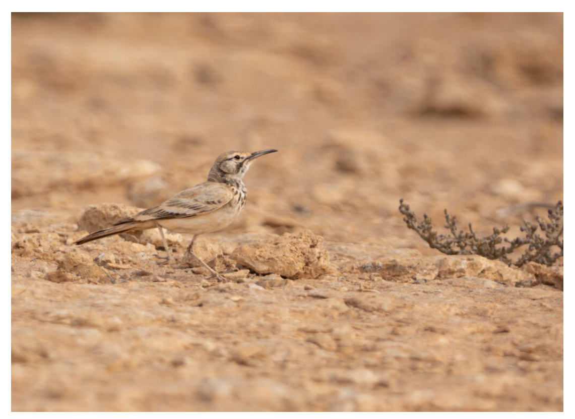
Greater Hoopoe-Lark