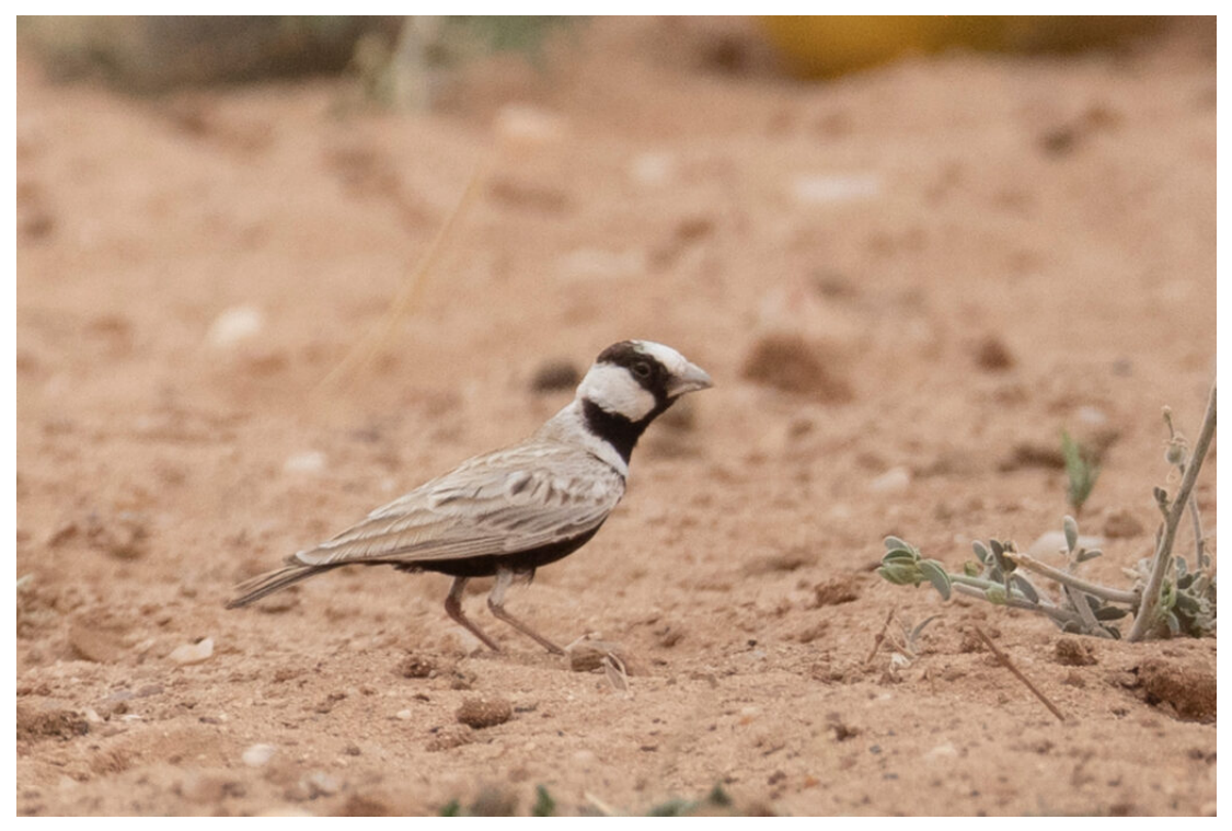
Black-crowned Sparrow-Lark