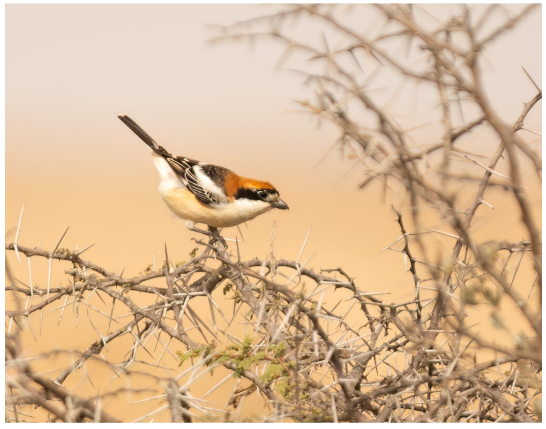
Woodchat Shrike