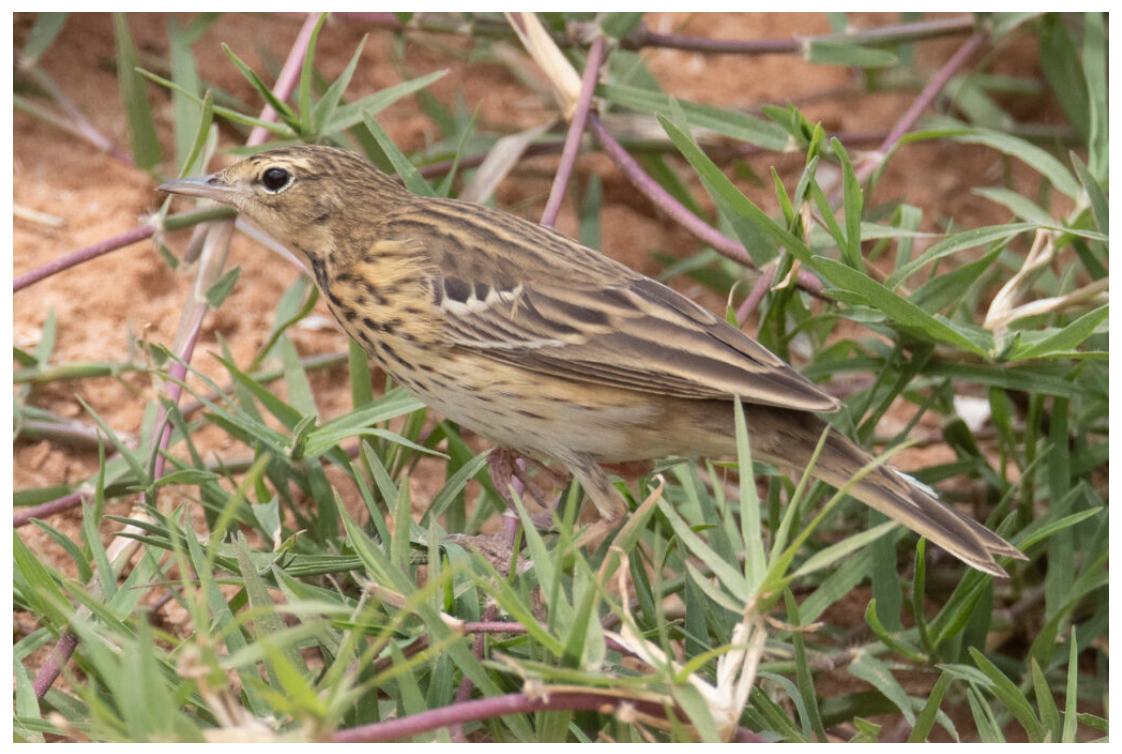
Tree Pipit