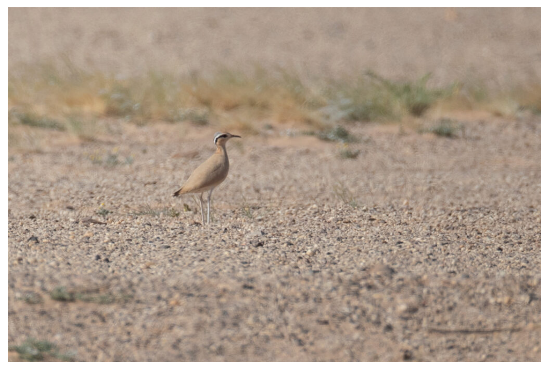
Cream-coloured Courser