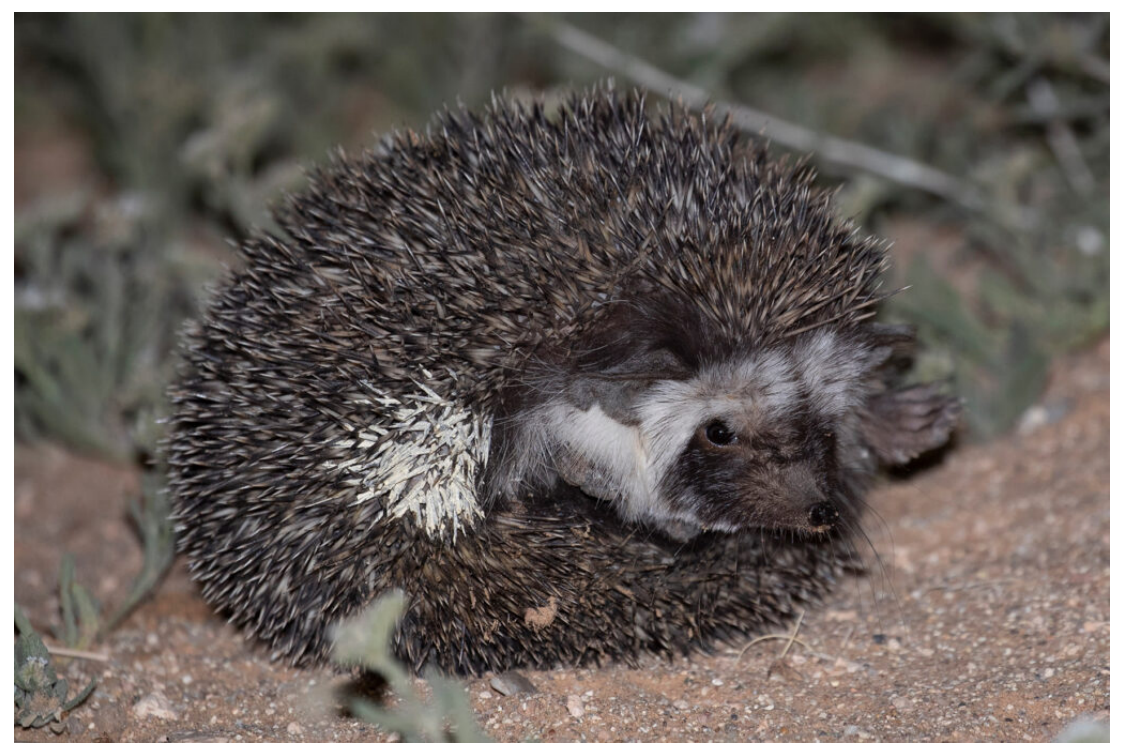
Desert Hedgehog