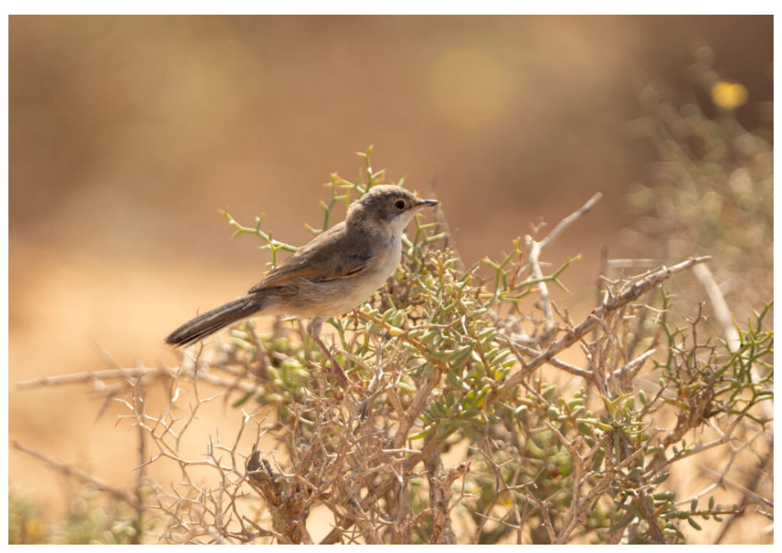
Spectacled Warbler