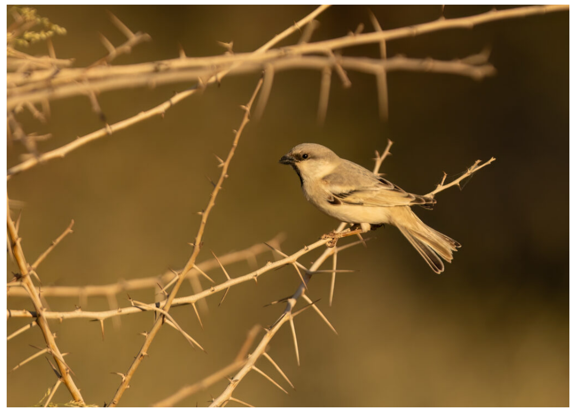
Desert Sparrow