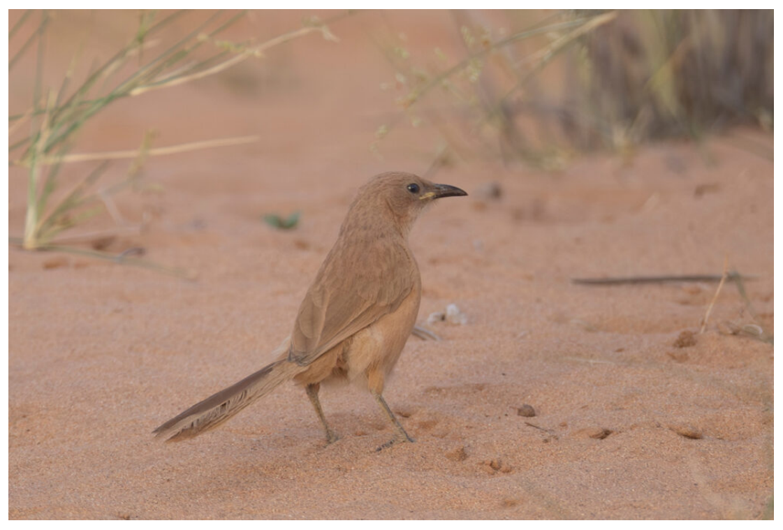
Fulvous Babbler