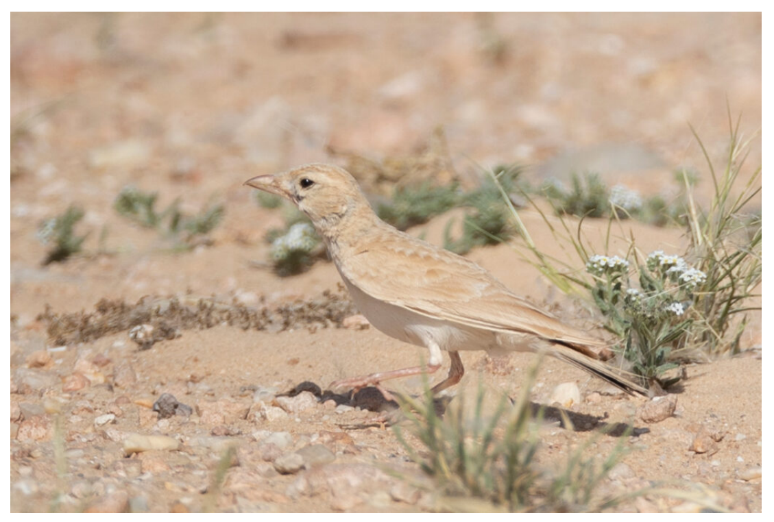
Dunn's Lark