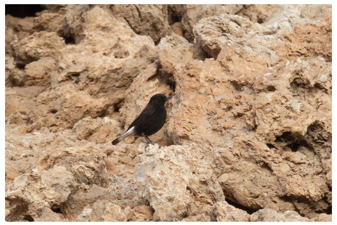
Black Wheatear