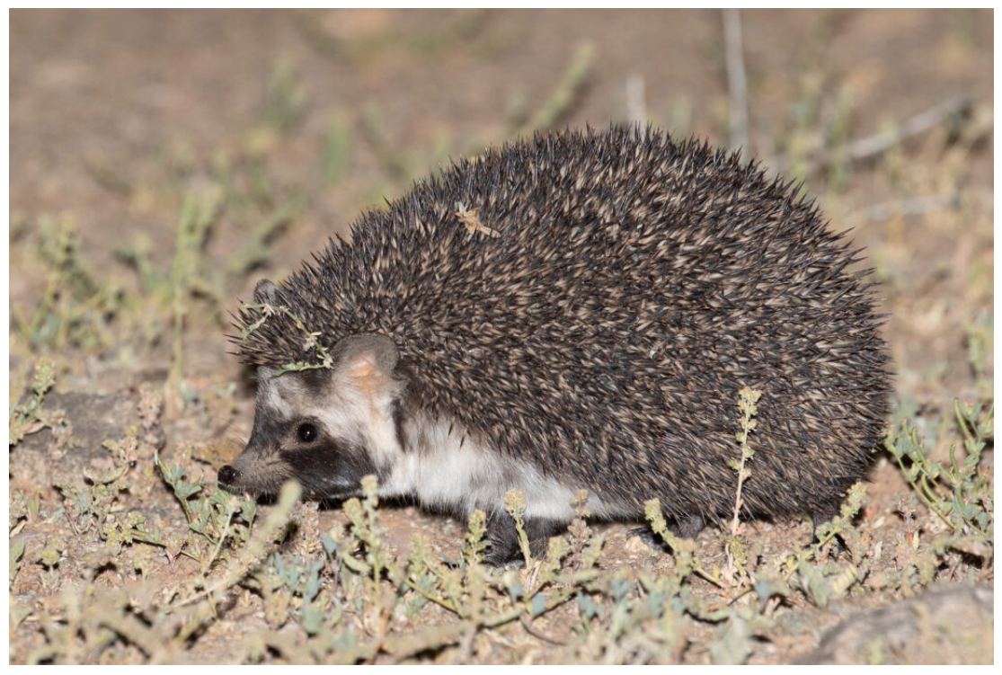
Desert Hedgehog