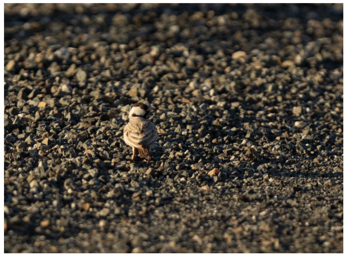
Black-crowned Sparrow-Lark