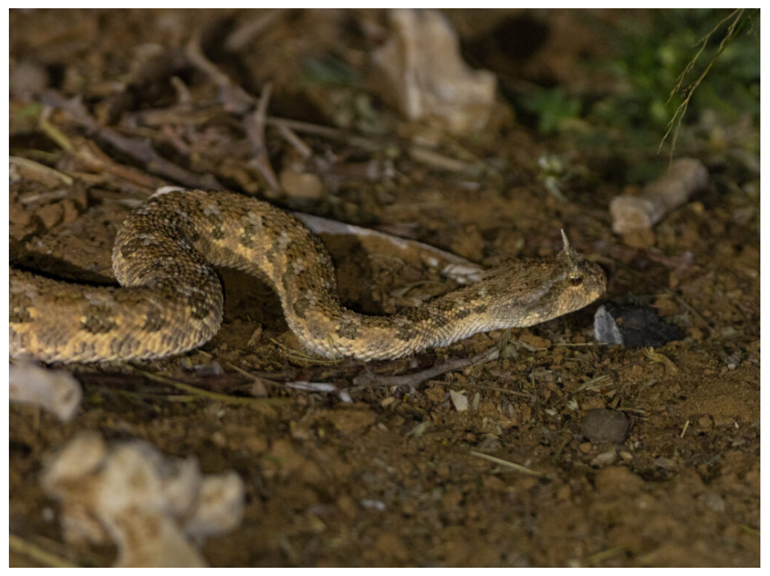
Saharan Horned Viper