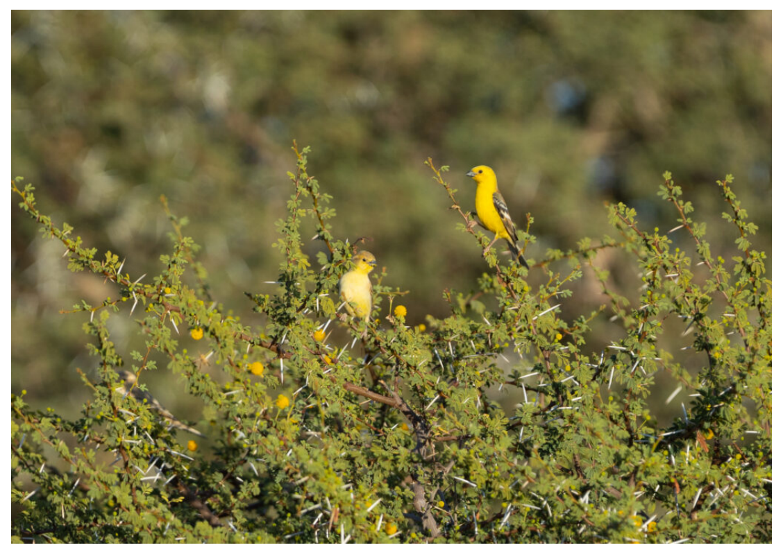
Sudan Golden Sparrows