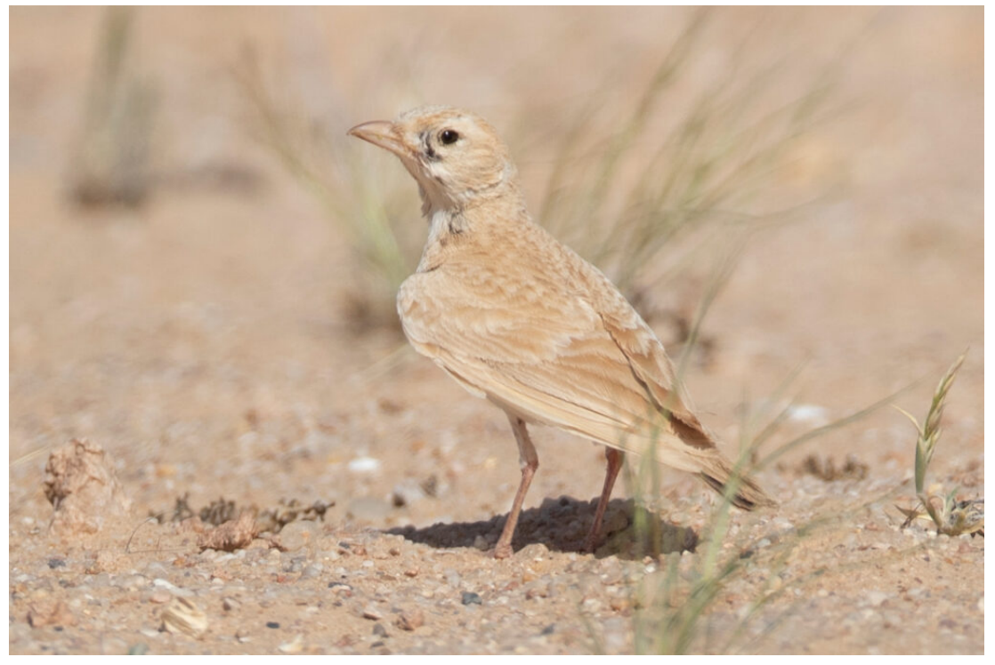
Dunn's Lark