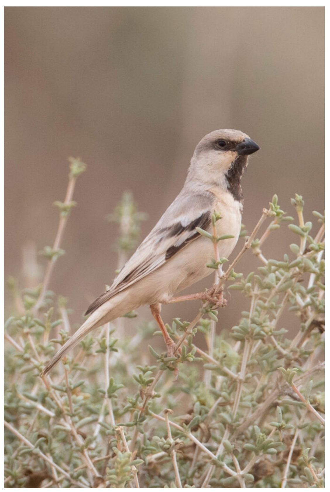
Desert Sparrow