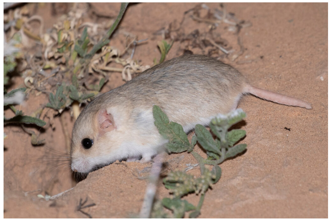
Fat-tailed Gerbil