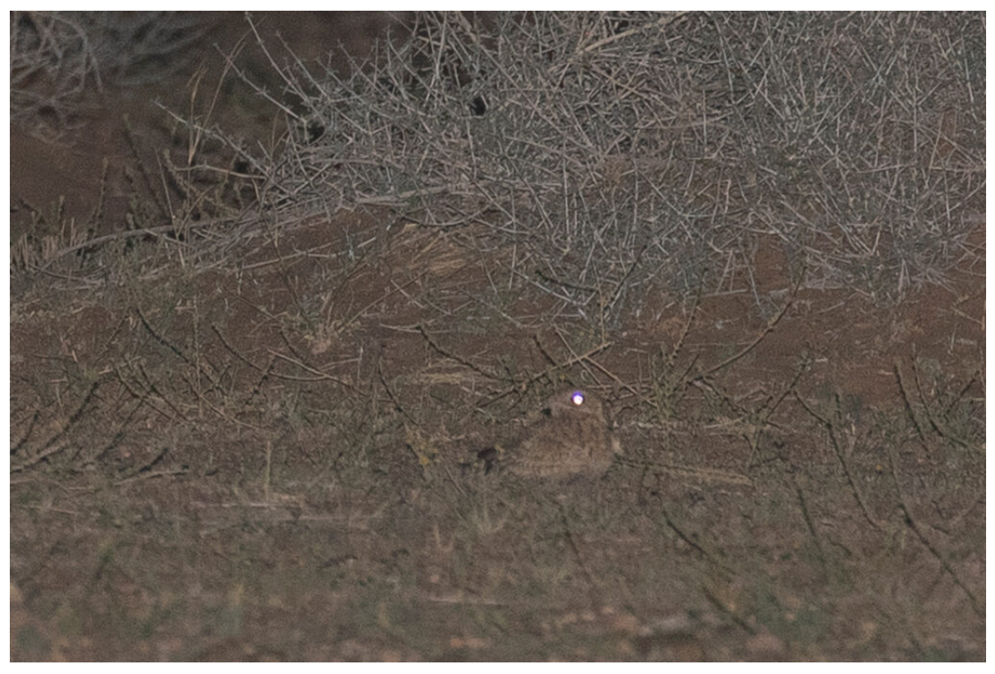
Golden Nightjar