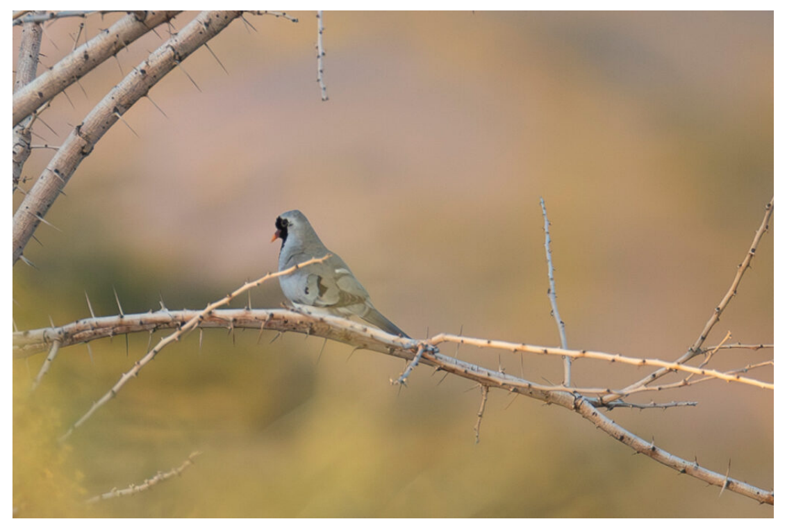
Namaqua Dove