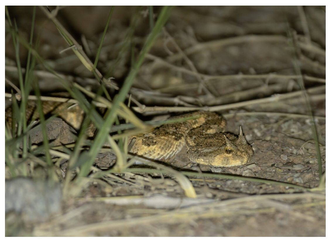
Saharan Horned Viper