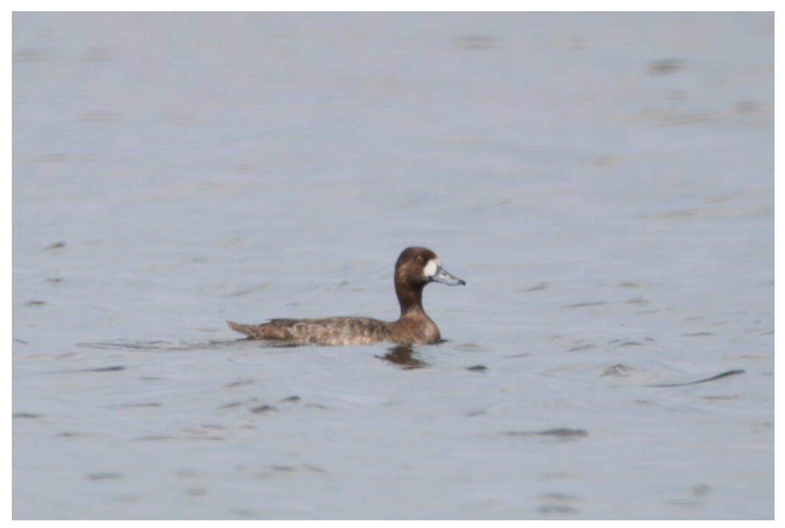
Lesser Scaup