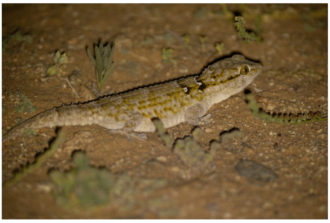
Ringed Wall Gecko Tarentola annularis