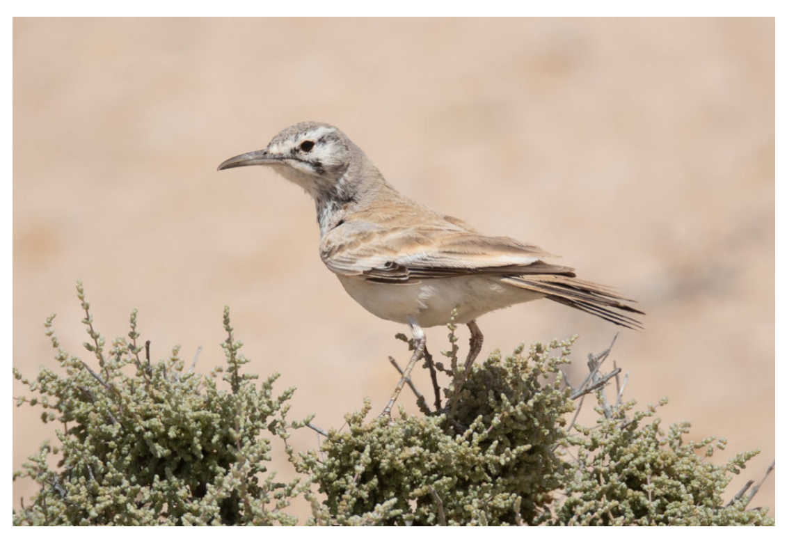
Greater Hoopoe-Lark