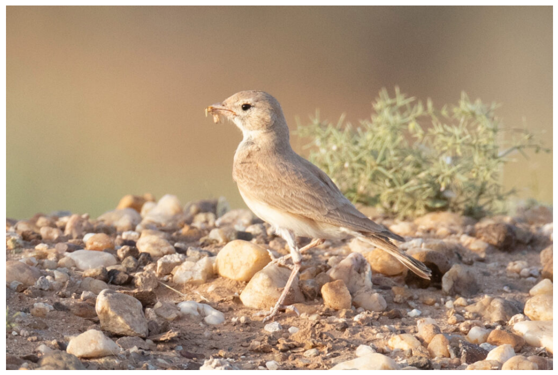
Bar-tailed Lark