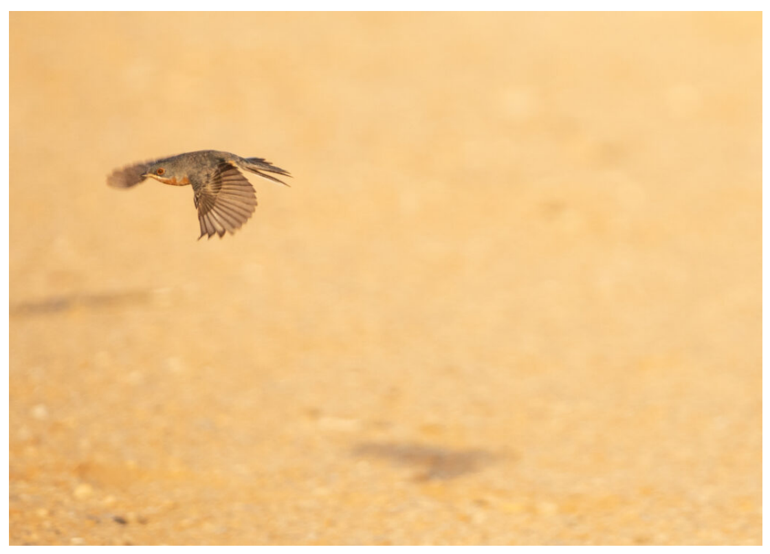
Western Subalpine Warbler