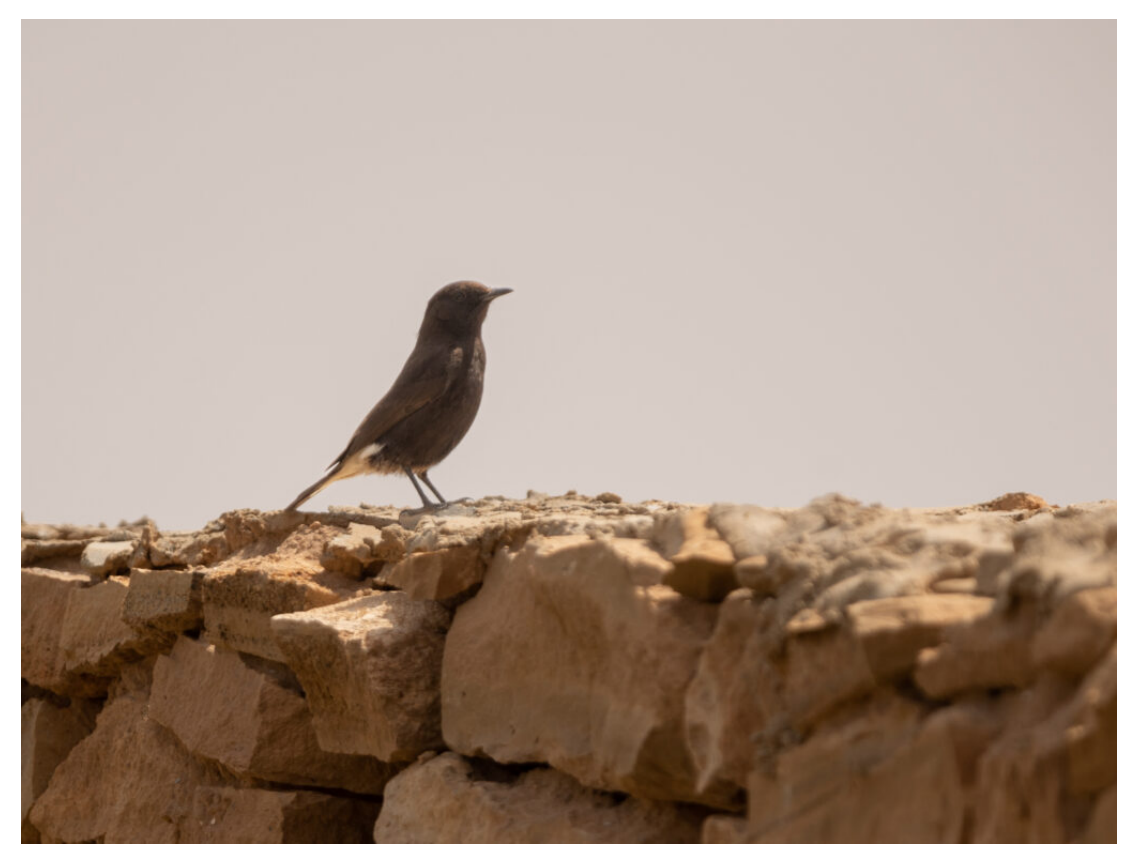
Black Wheatear