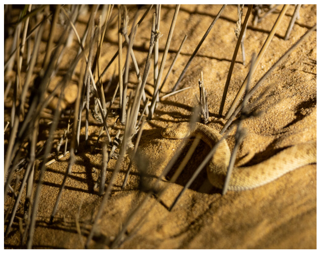
Cerastes vipera