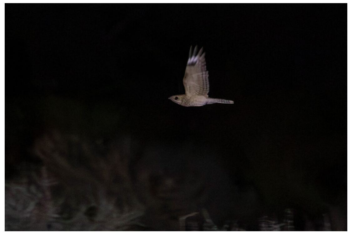
Golden Nightjar