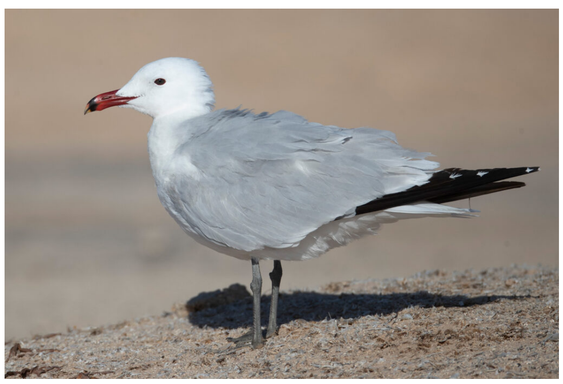
Audouins Gull