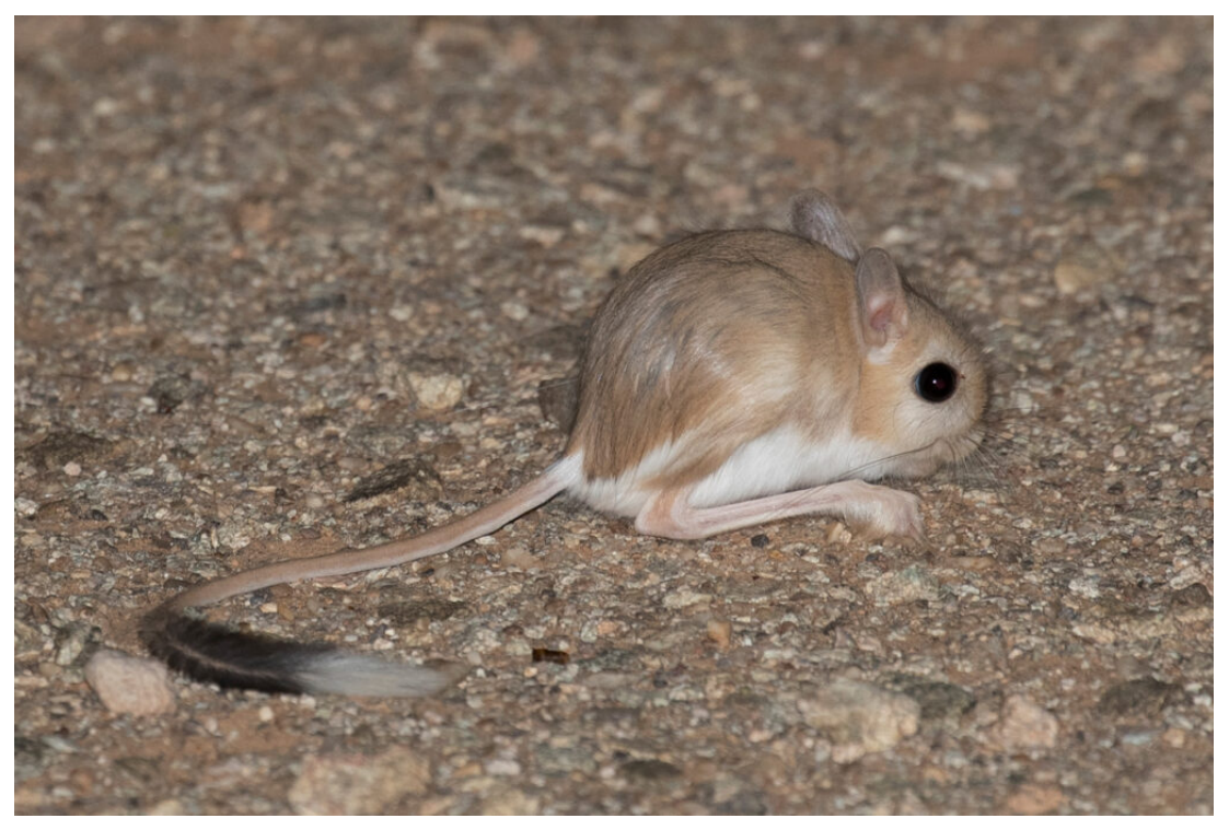
Egyptian Lesser Jerboa