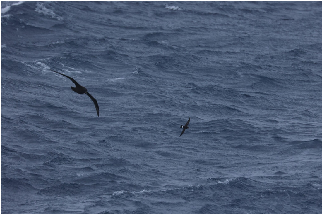
Black Petrel and New Zealand Storm Petrel