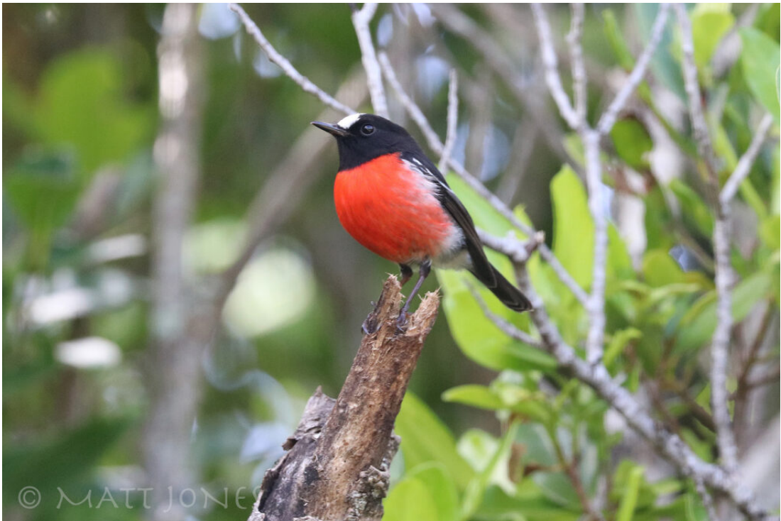
male Norfolk Robin