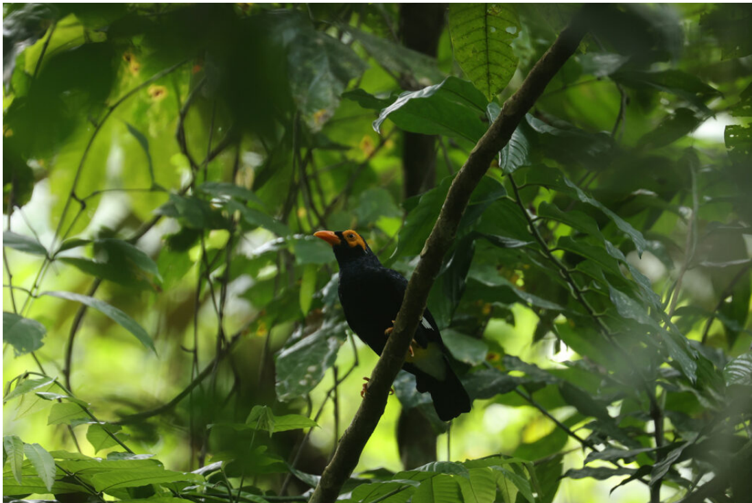
Long-tailed Myna