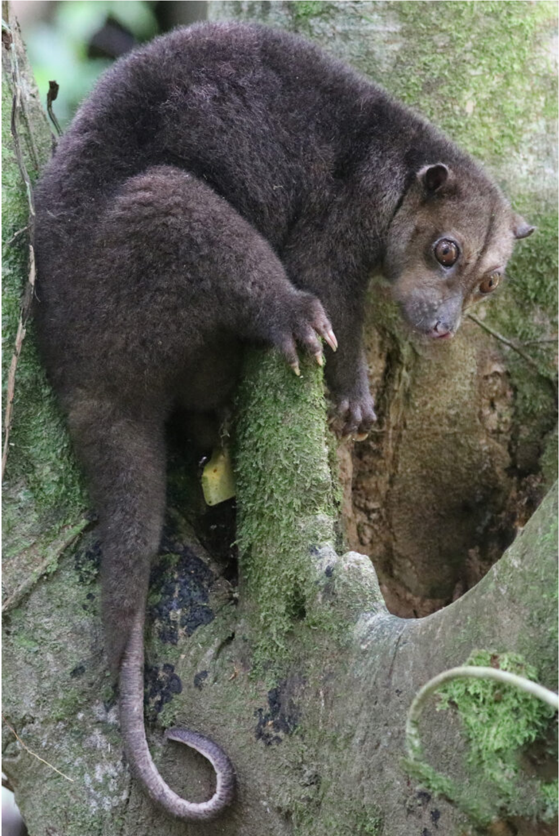
Northern Common Cuscus