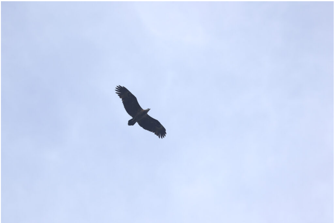
Sanford's Sea Eagle (image by Matt Eade)