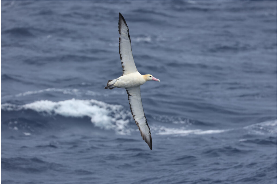
Short-tailed Albatross