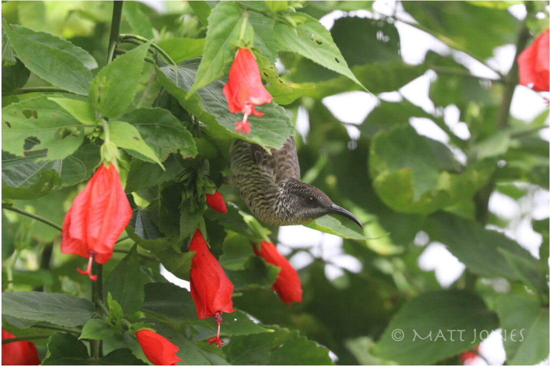
Barred Honeyeater