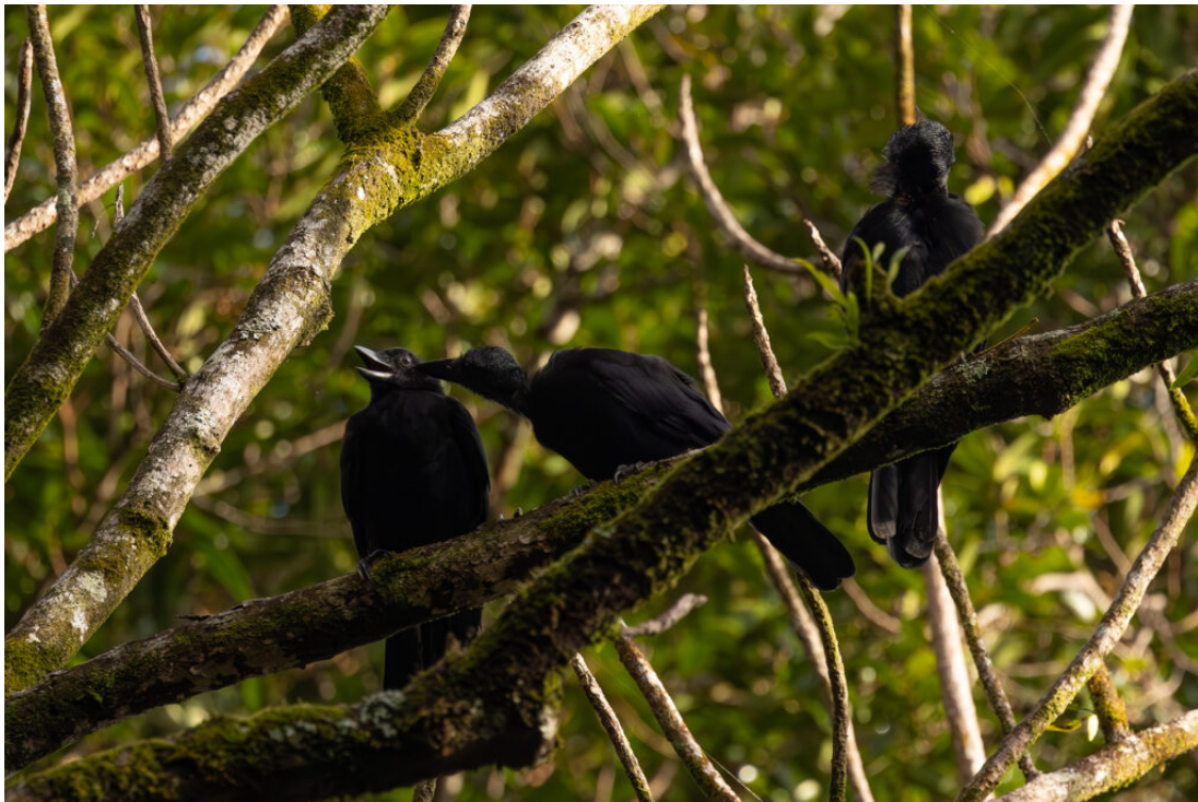
New Caledonian Crow