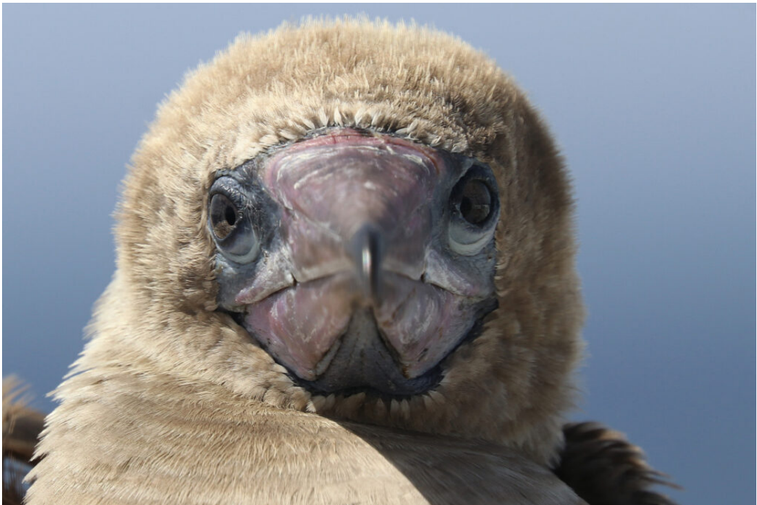
Red-footed Booby