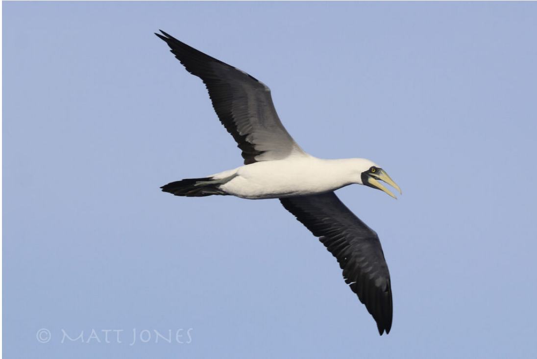
Masked Booby