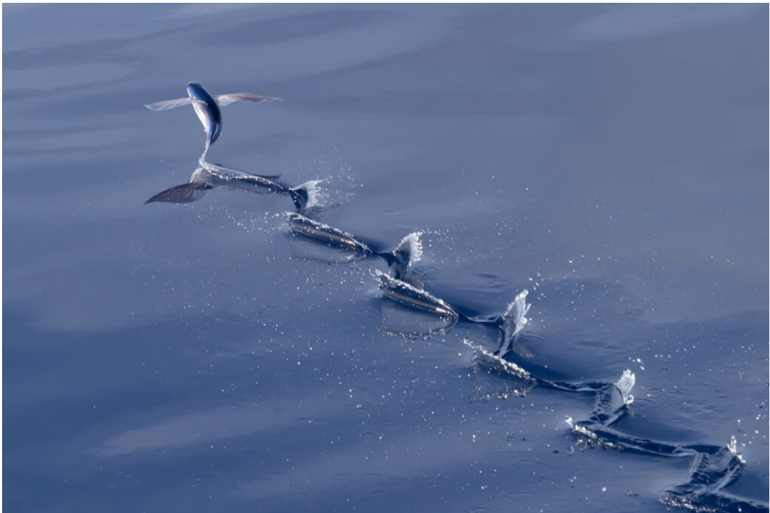
Flying Fish sp