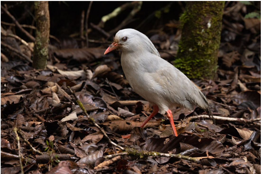
Kagu