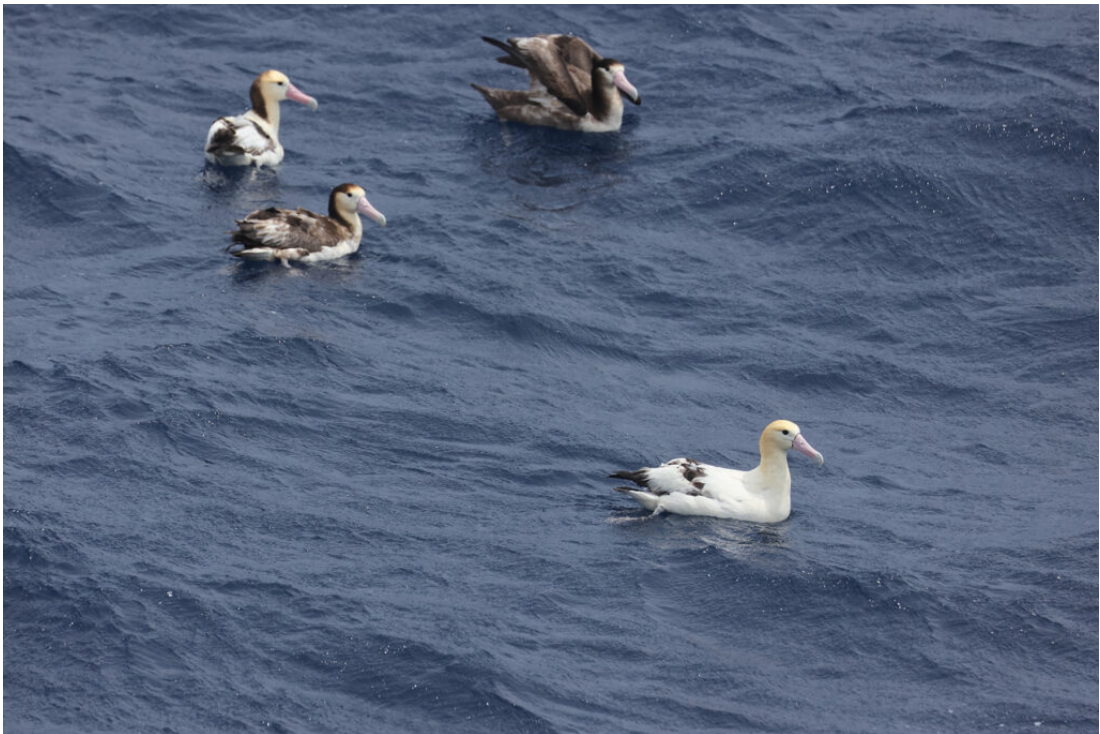
Short-tailed Albatross