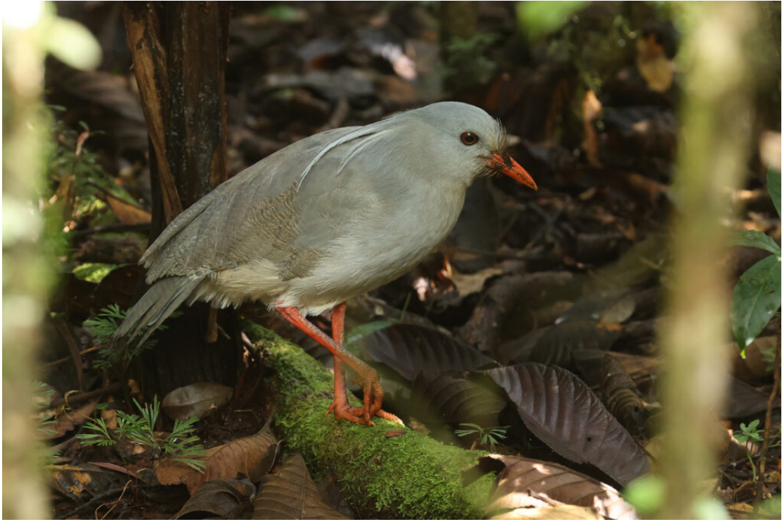
Kagu, one of top targets for the trip