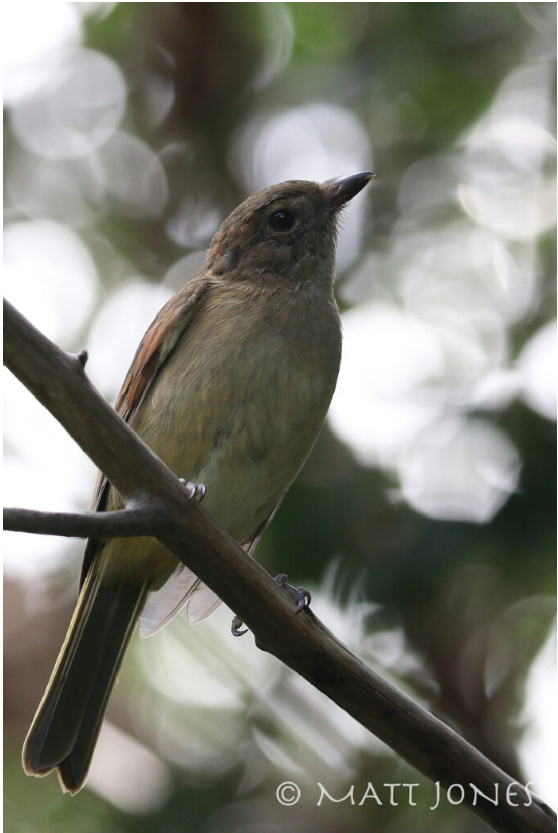
female Australian Golden Whistler, Norfolk Island subspecies