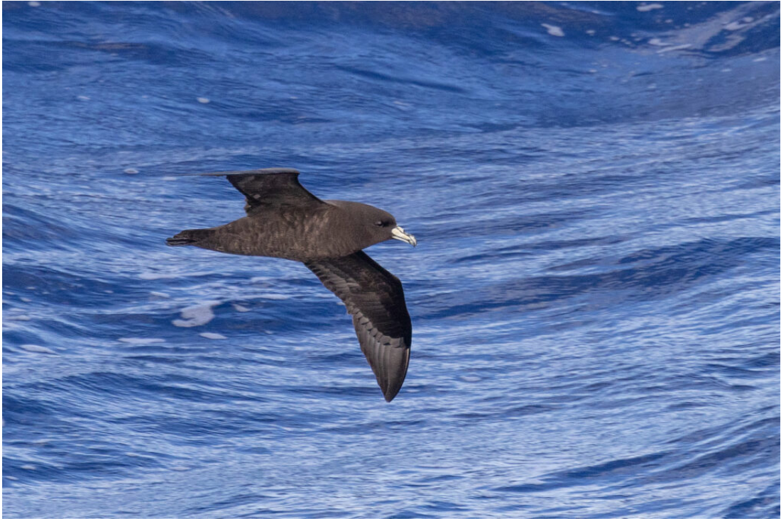
Black Petrel