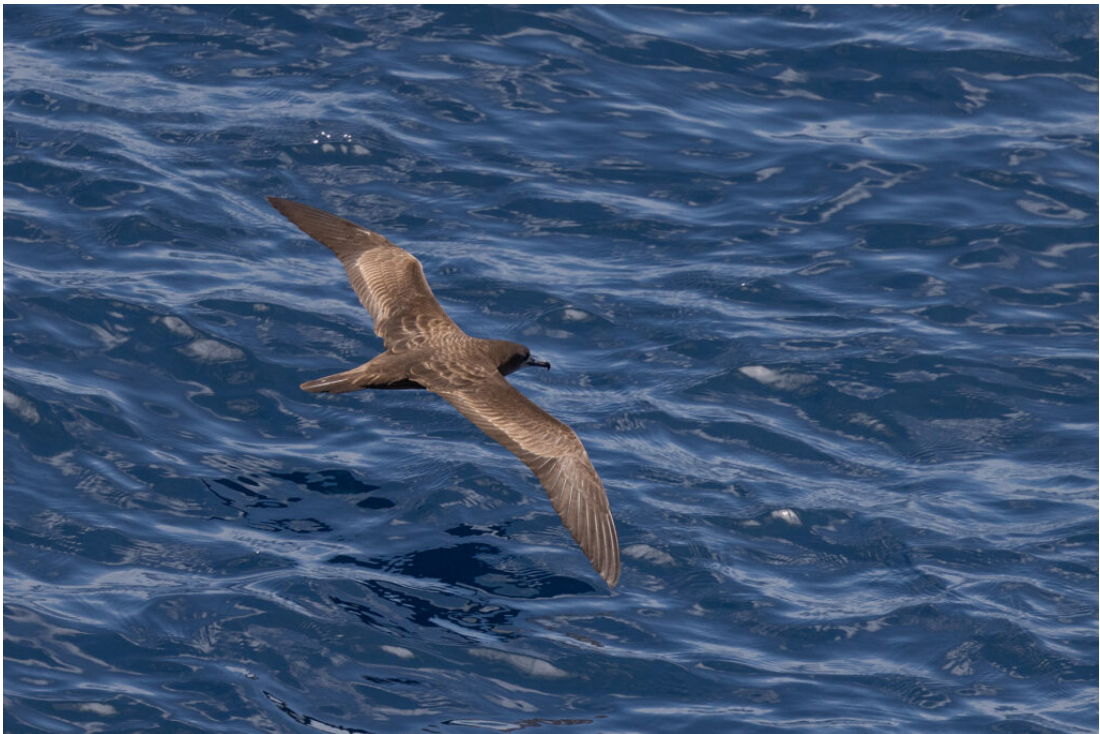
Wedge-tailed Shearwater