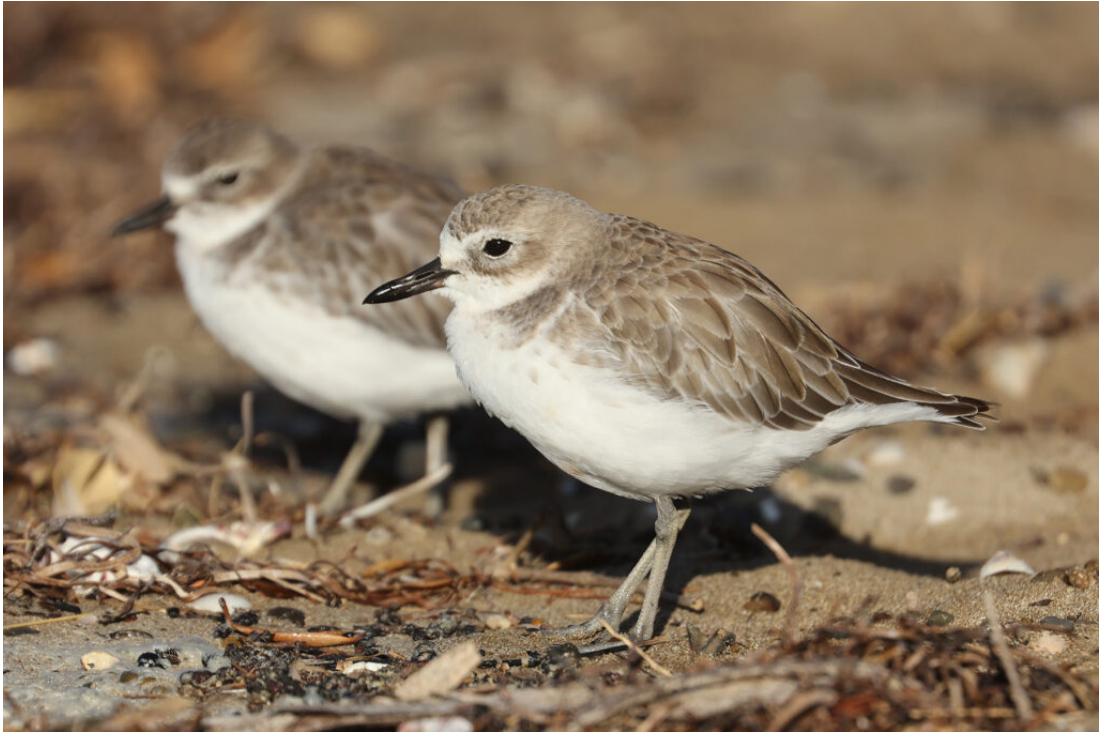
New Zealand Dotterel