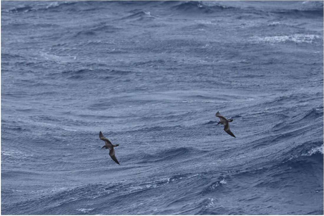
Buller's Shearwaters