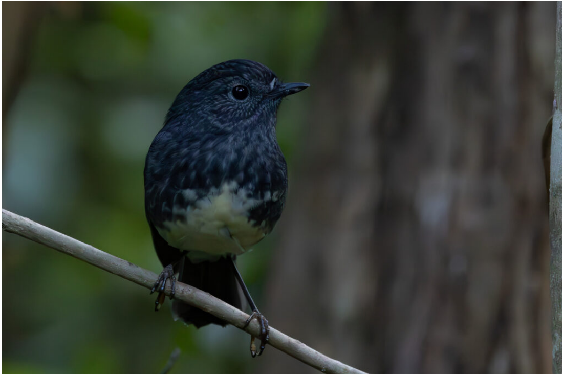
North Island Robin