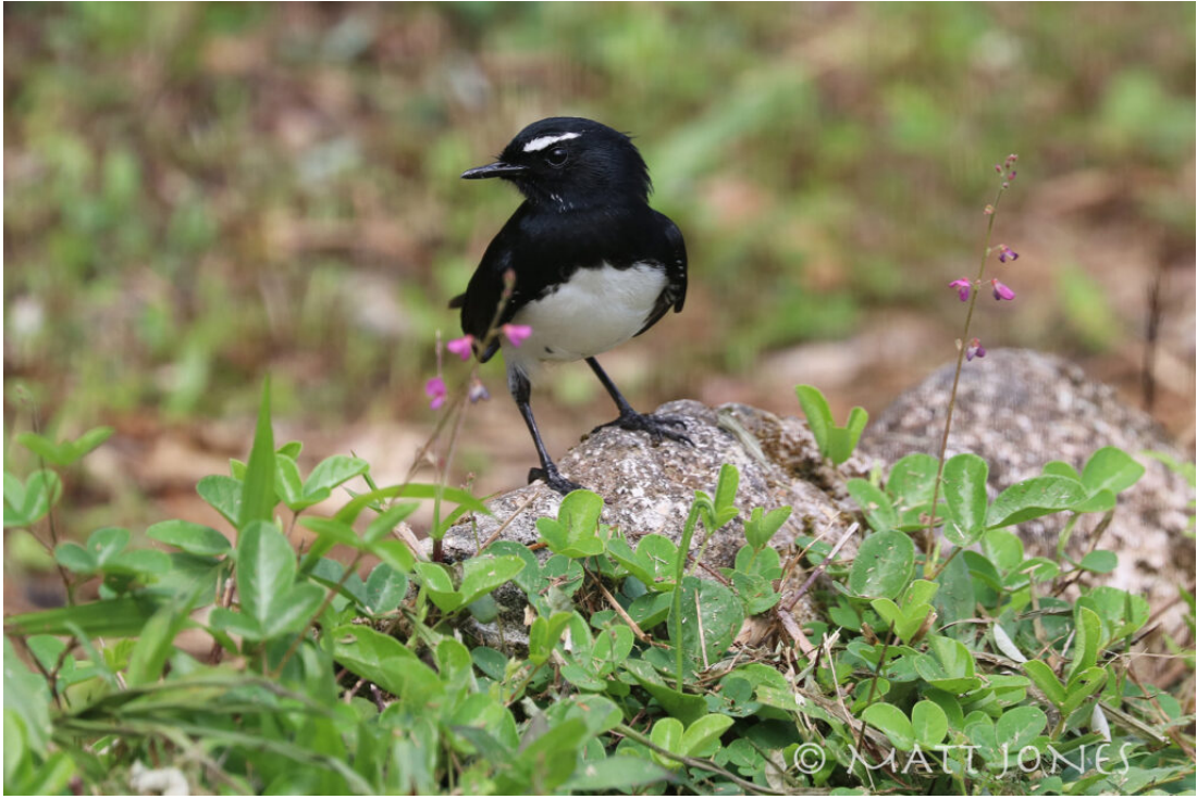
Willie Wagtail