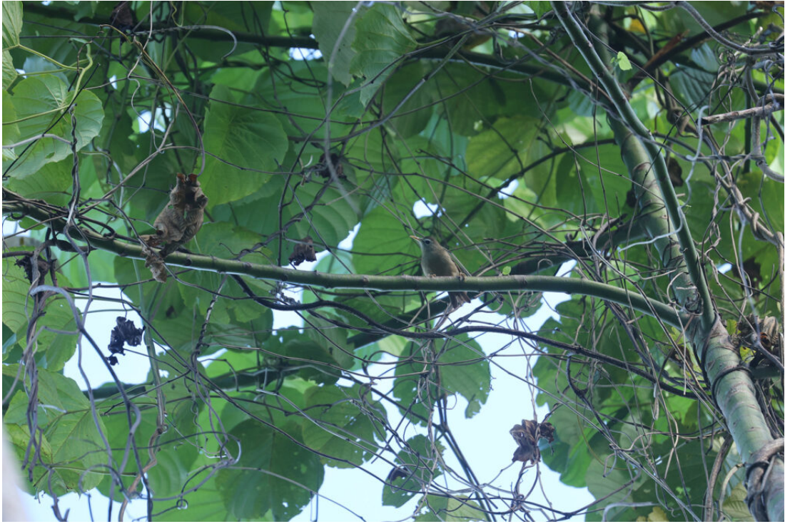
Sanford's White-eye