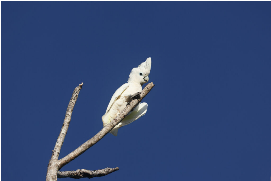
Solomons Cockatoo