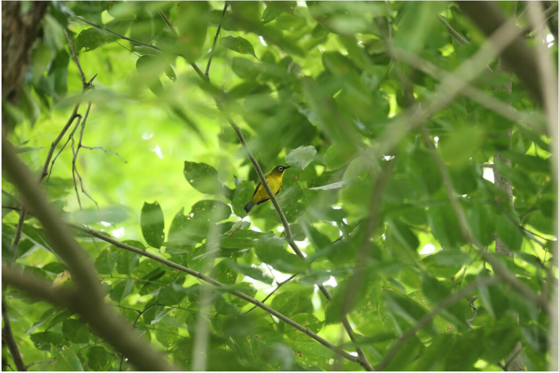
Ranongga White-eye