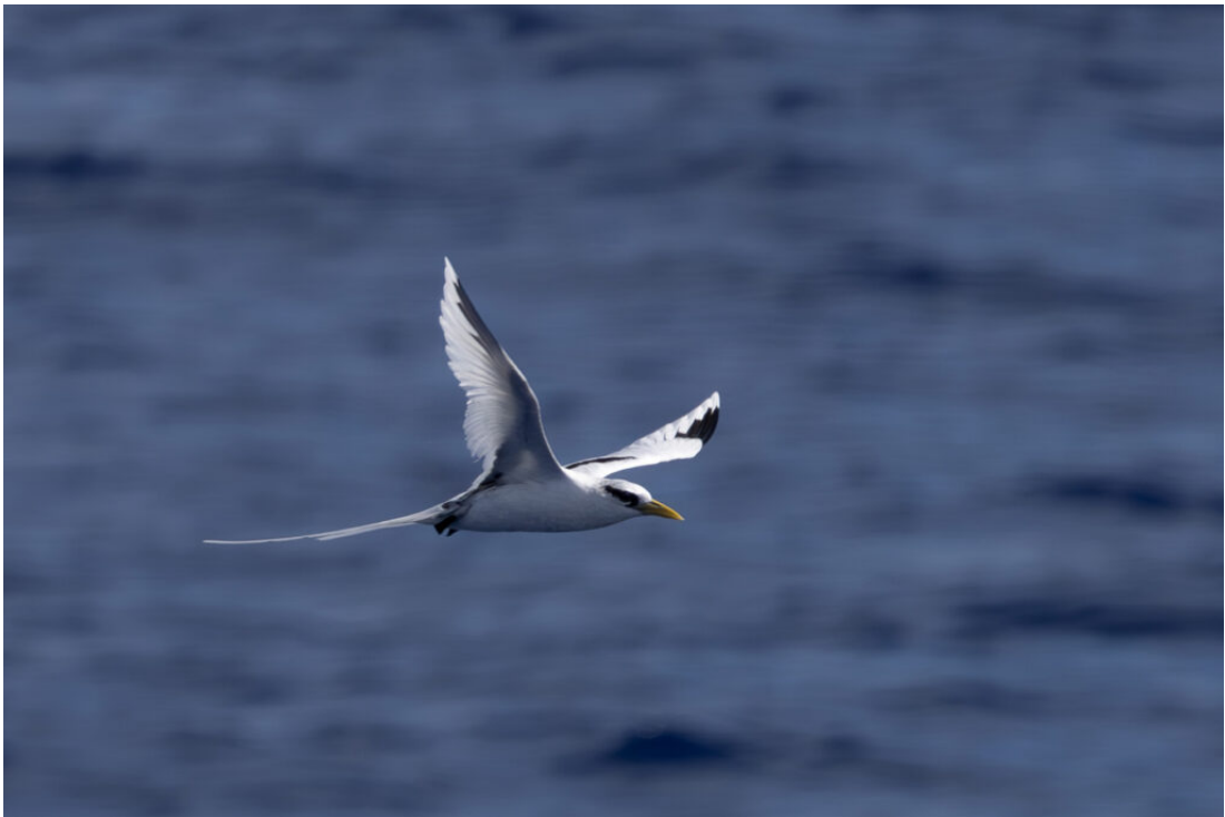
White-tailed Tropicbird