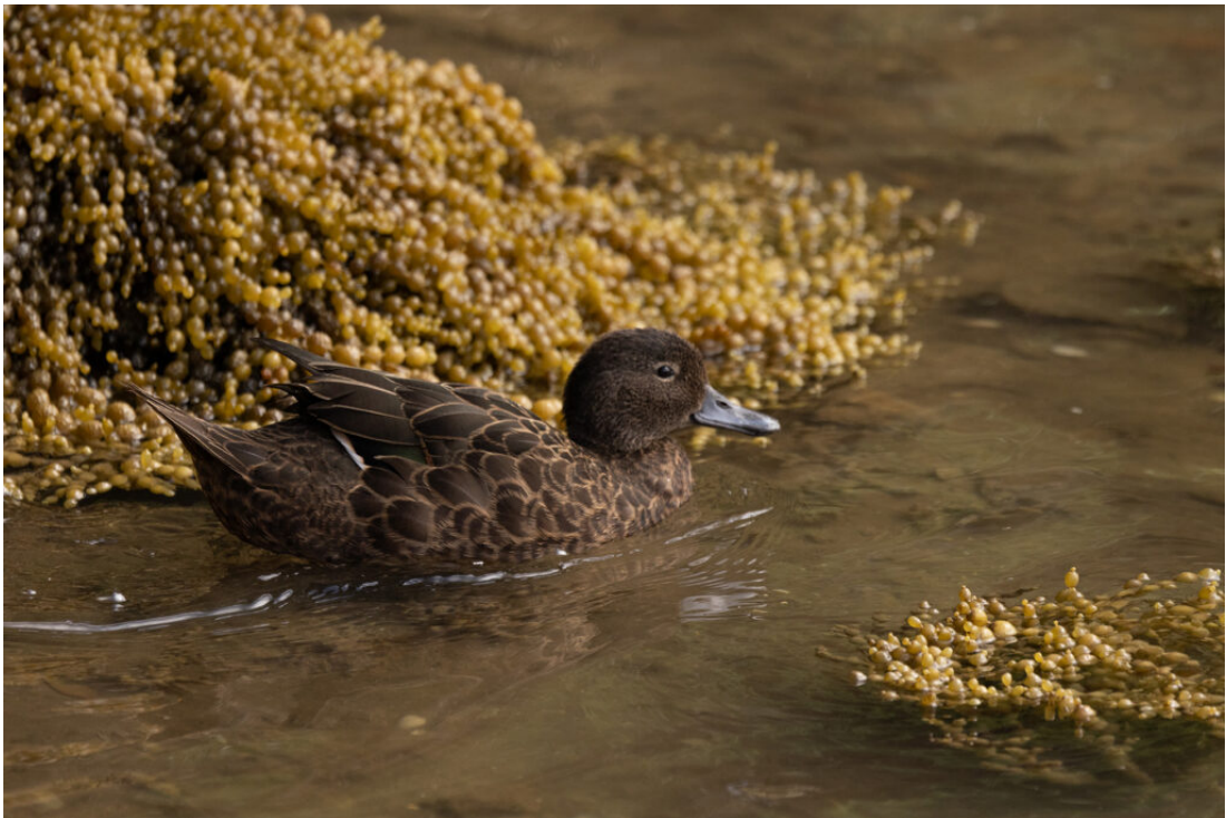
Brown Teal