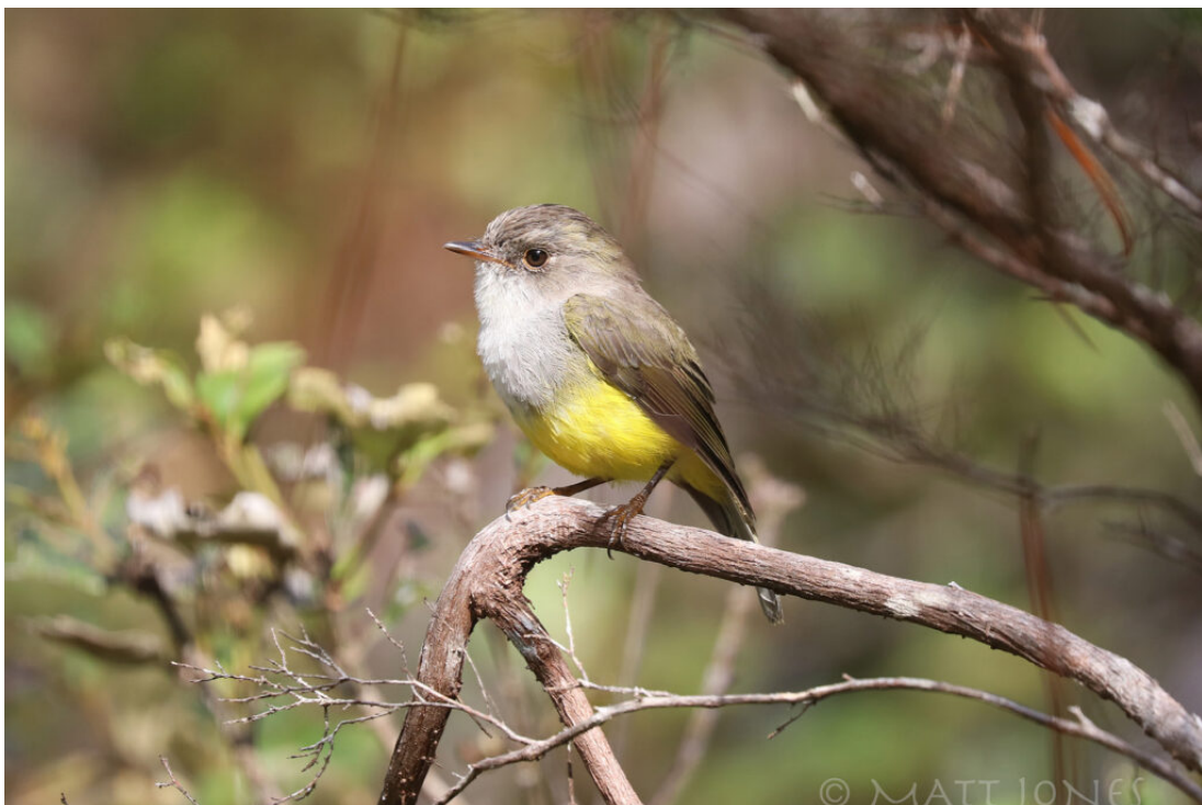
Yellow-bellied Flyrobin

Pacific Flying Fox Pteropus tonganus One seen on New Caledonia.