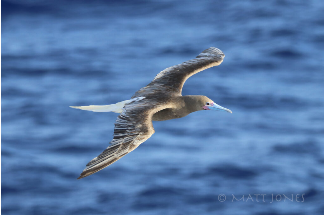
Red-footed Booby