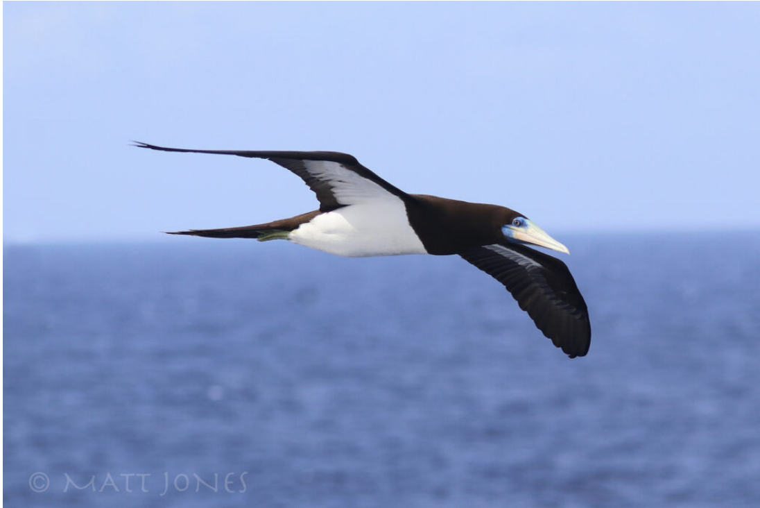
Brown Booby