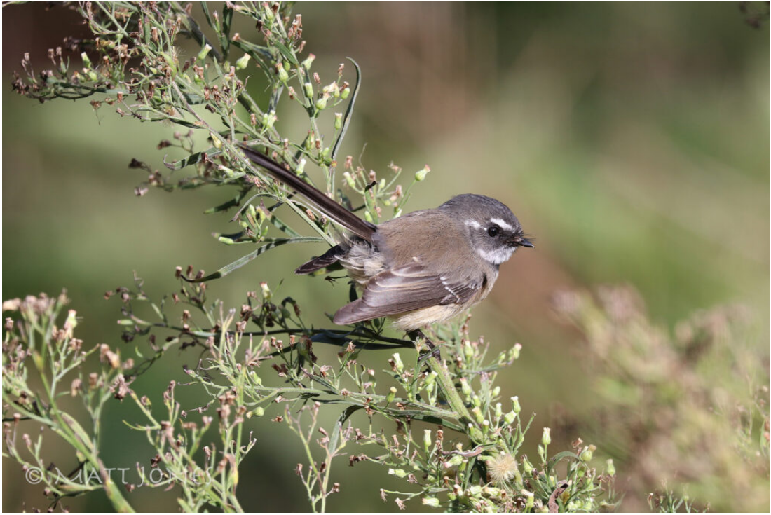
Grey Fantail