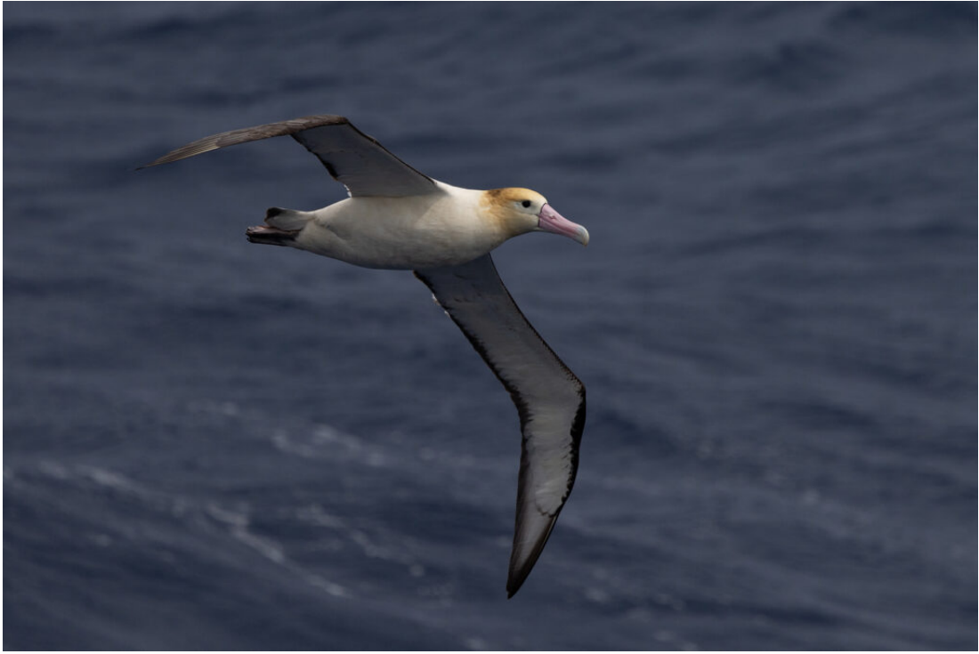
Short-tailed Albatross