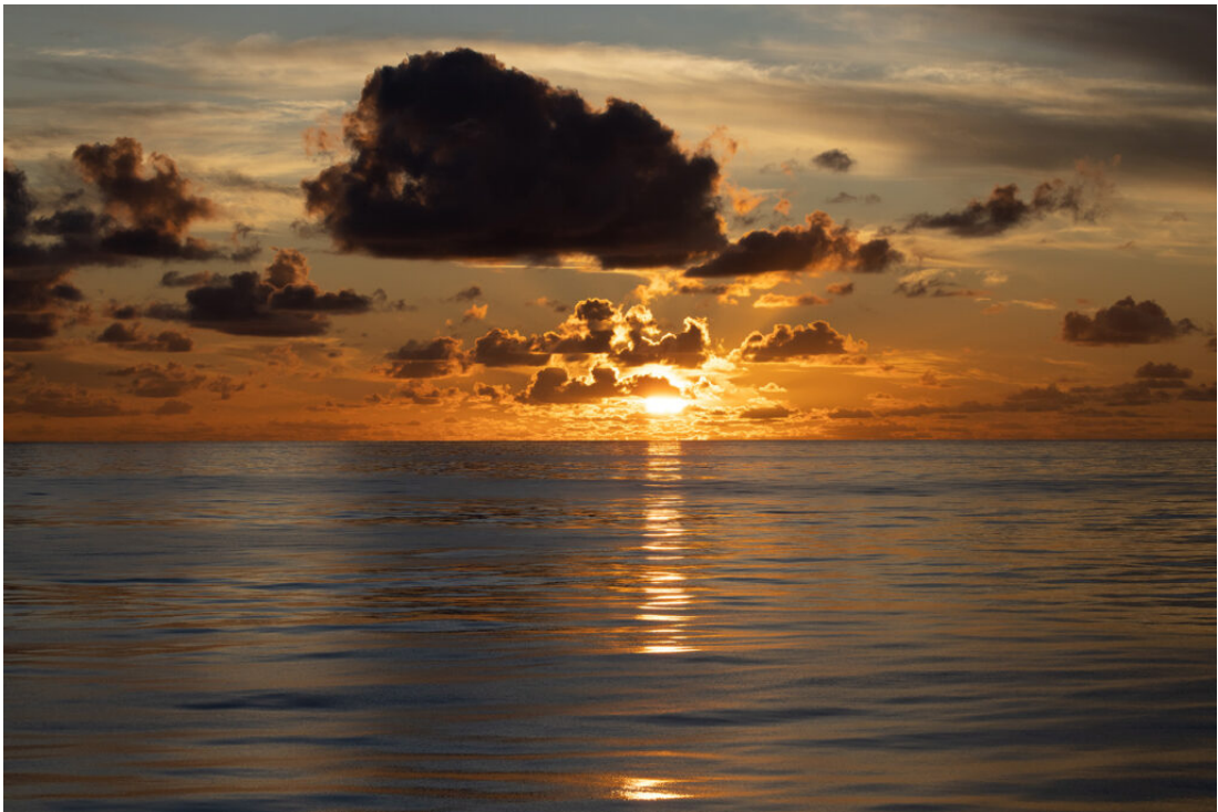
One of the many Pacific Ocean sunsets we were treated to