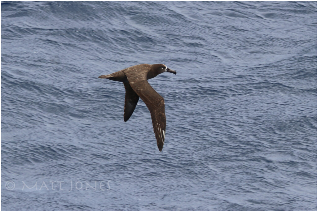
Black-footed Albatross