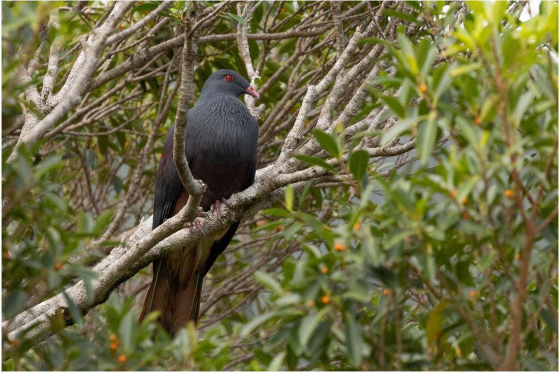
Goliath Imperial Pigeon