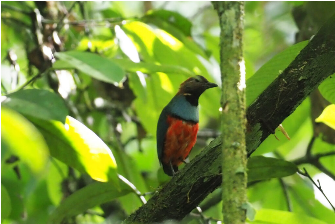
Papuan Pitta