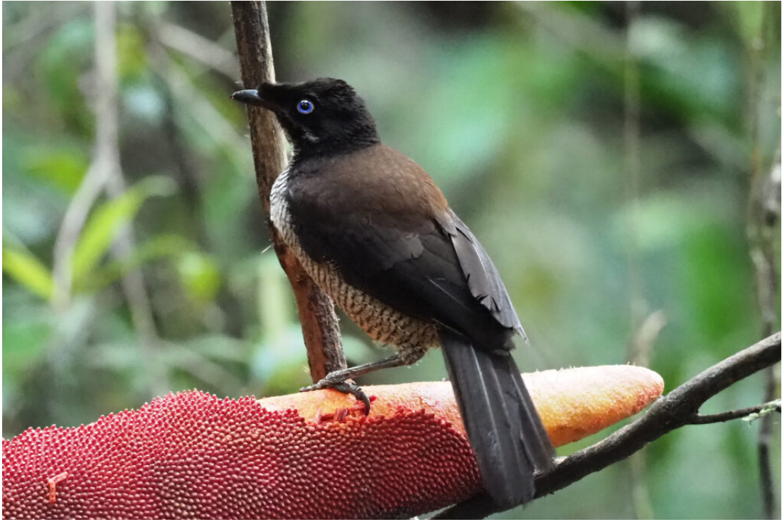
female Western Parotia