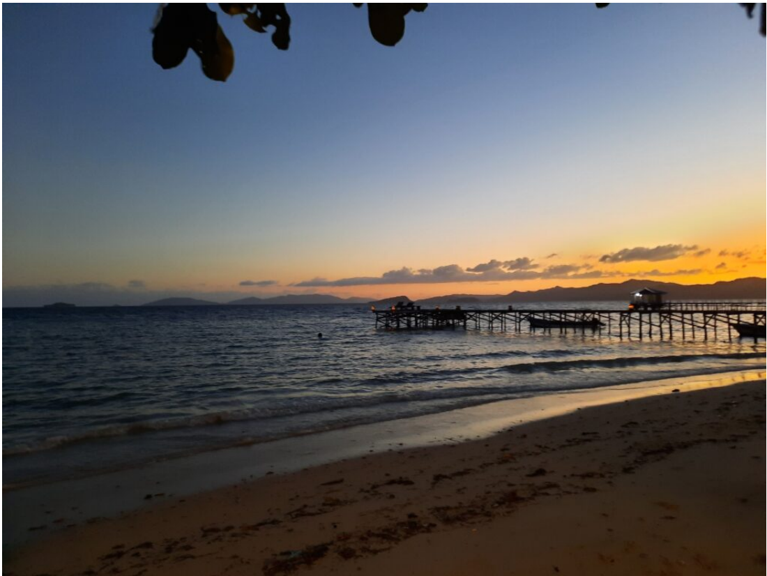
Waigeo