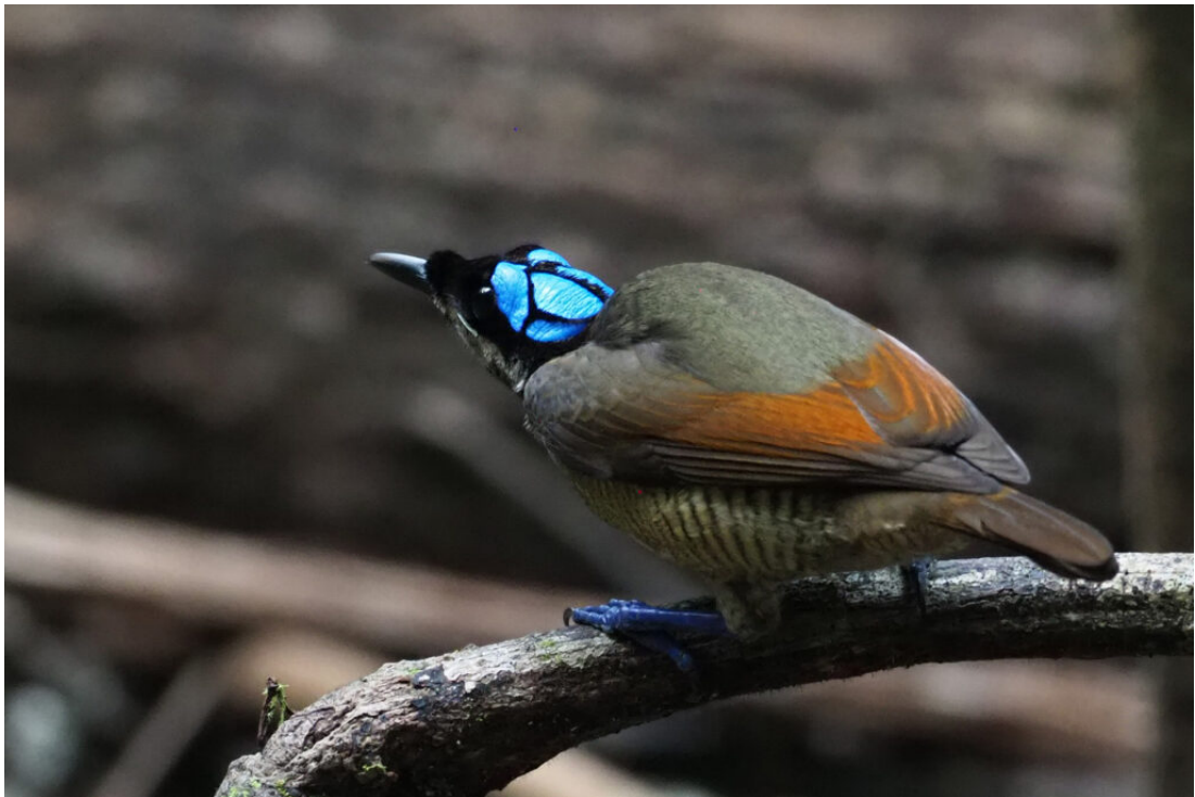
Wilson's Bird-of-paradise