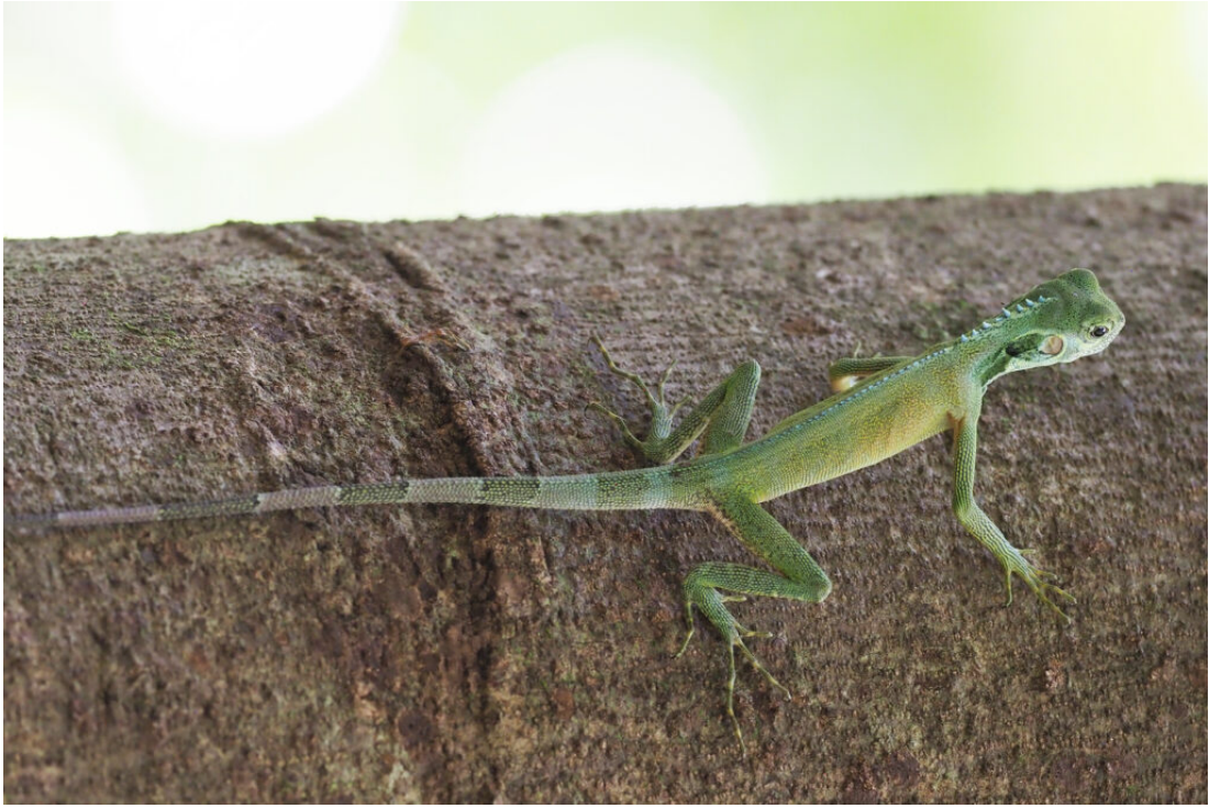
Lizard Malagufuk