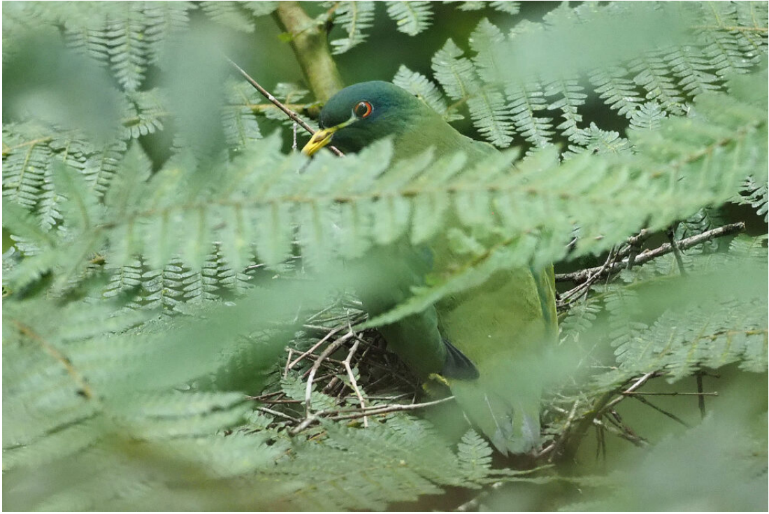
White-bibbed (Mountain) Fruit Dove