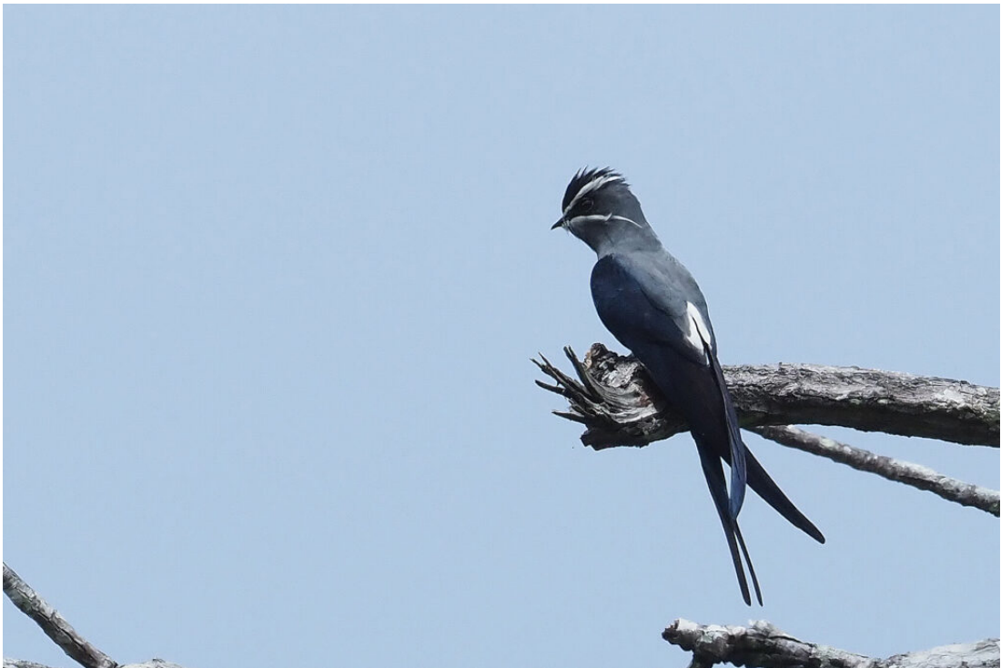
Moustached Treeswift