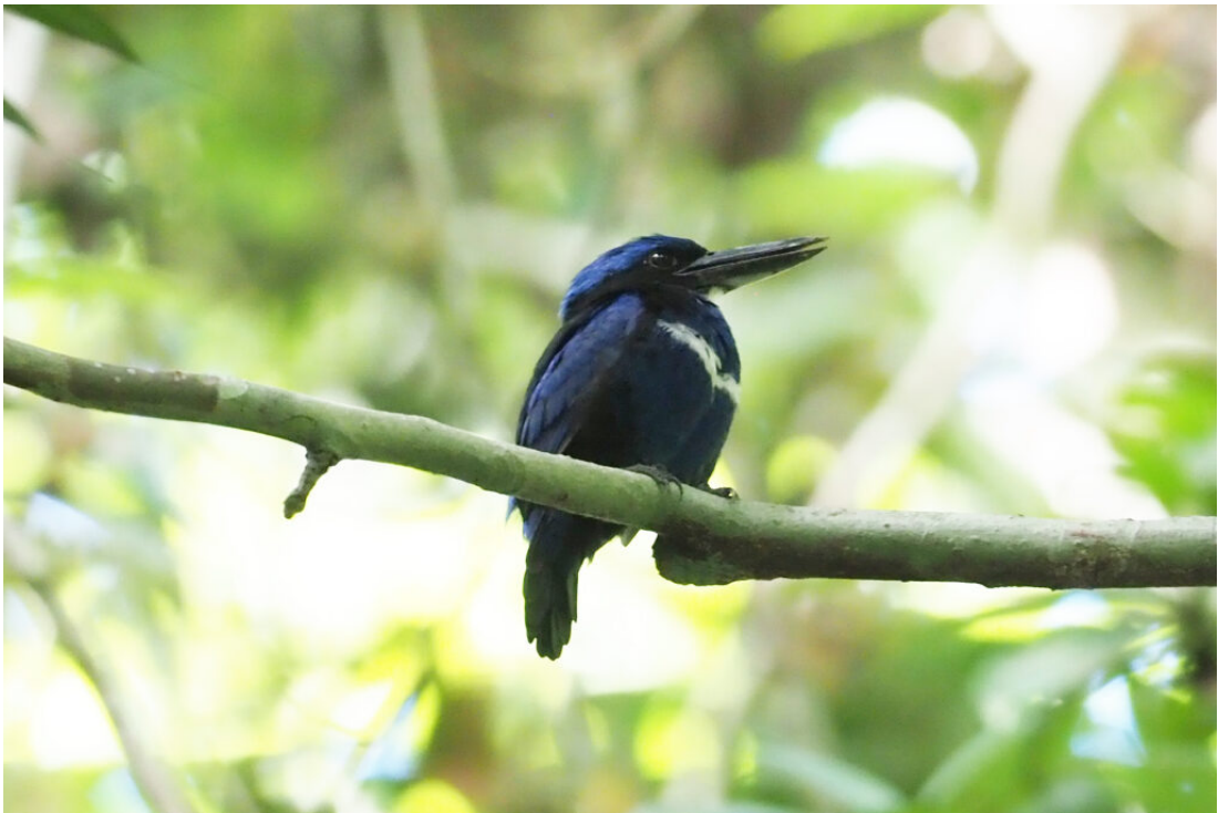
Blue-black Kingfisher