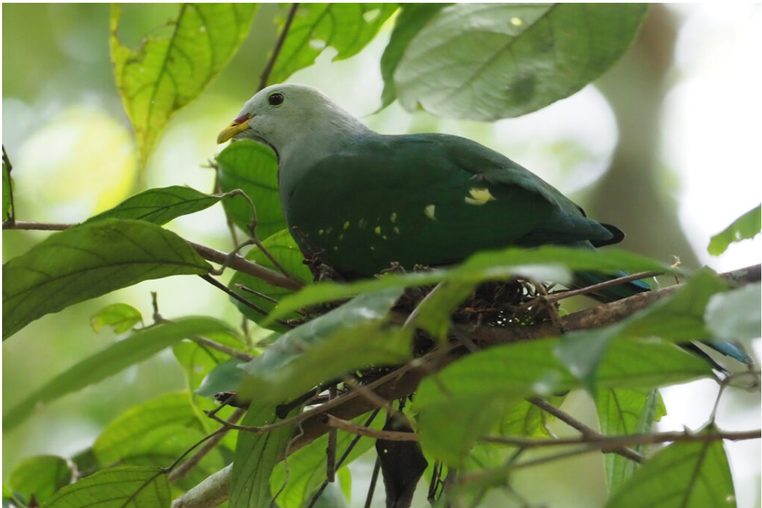
Wompoo Fruit Dove