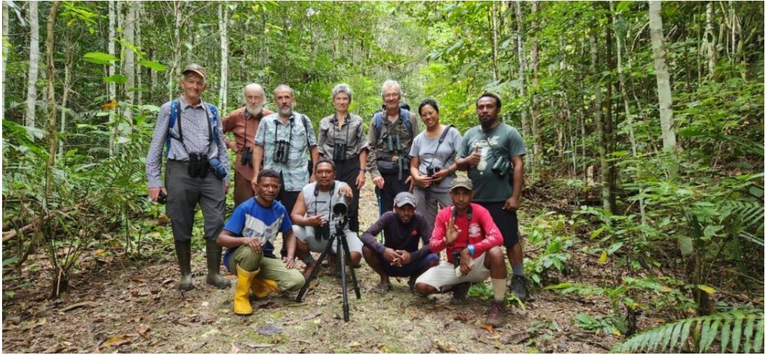
The group