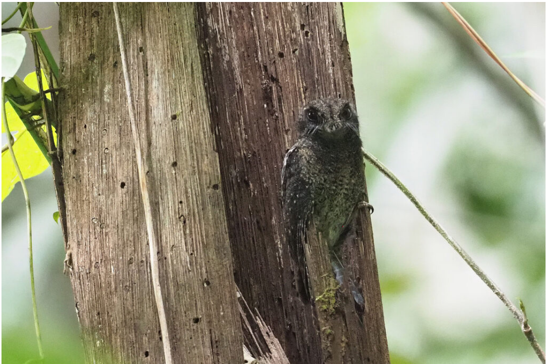
Wallace's Owlet-Nightjar