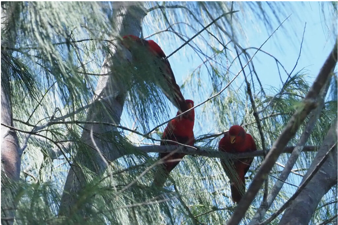
Violet-necked Lory