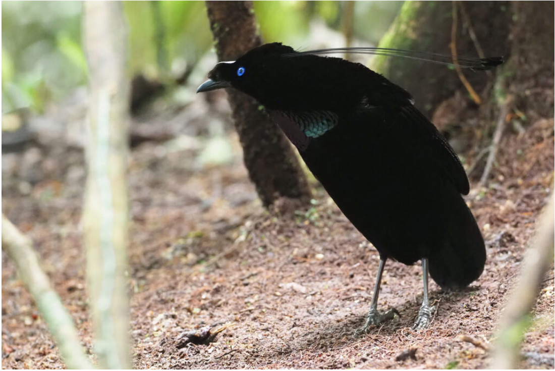
Western Parotia