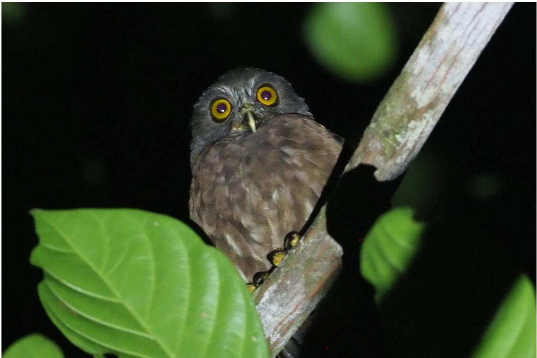
Papuan Boobook