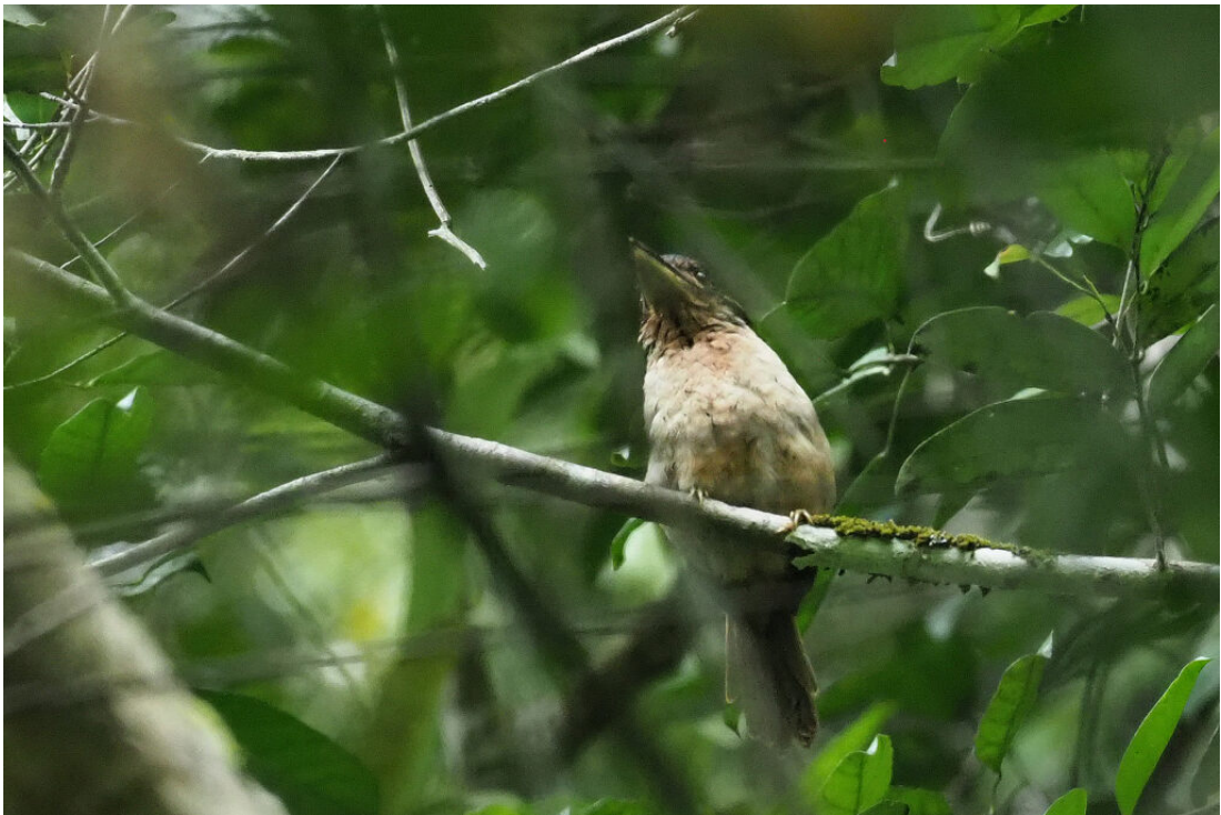
Hook-billed Kingfisher