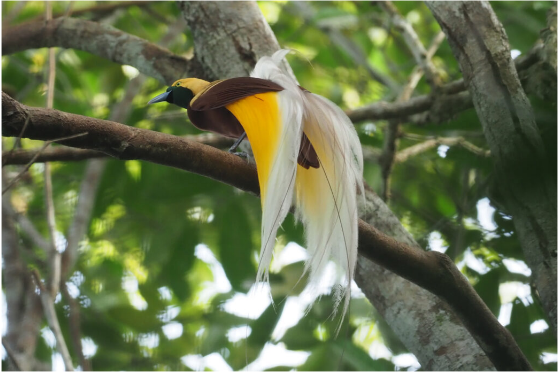
Lesser Bird-of-paradise