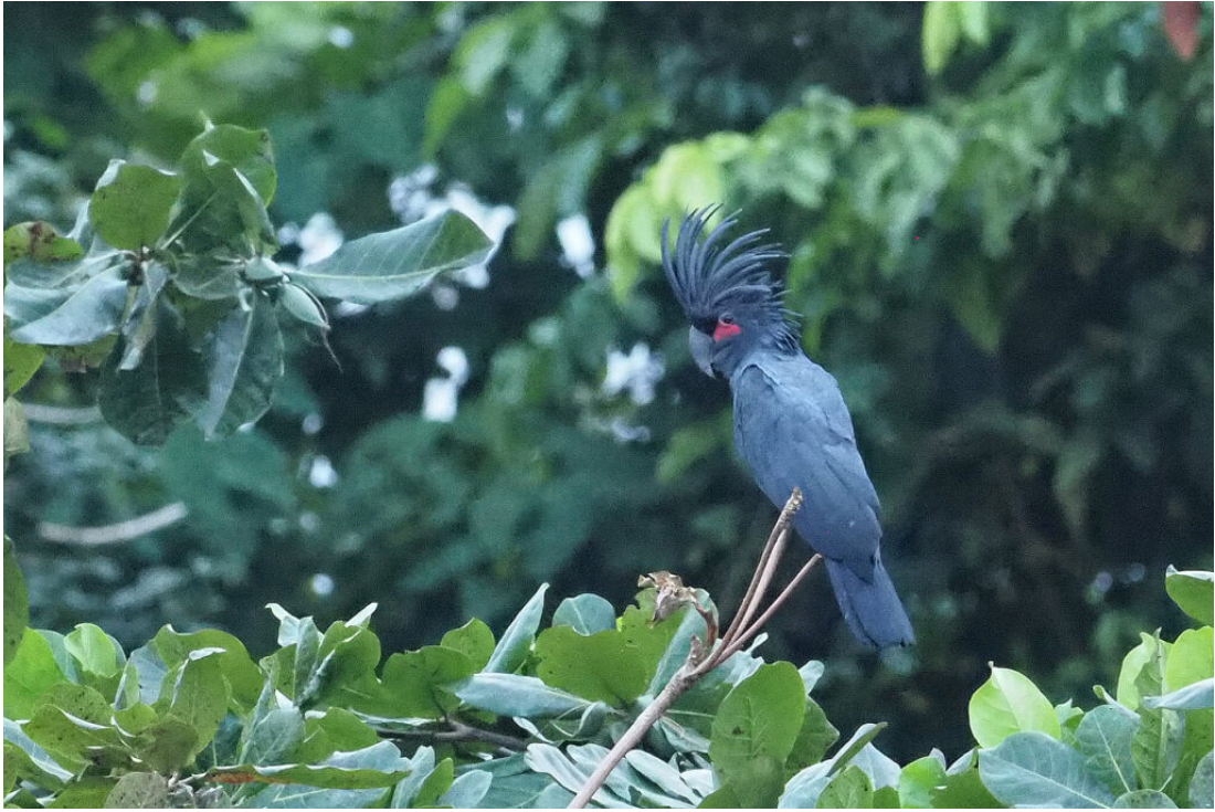
Palm Cockatoo