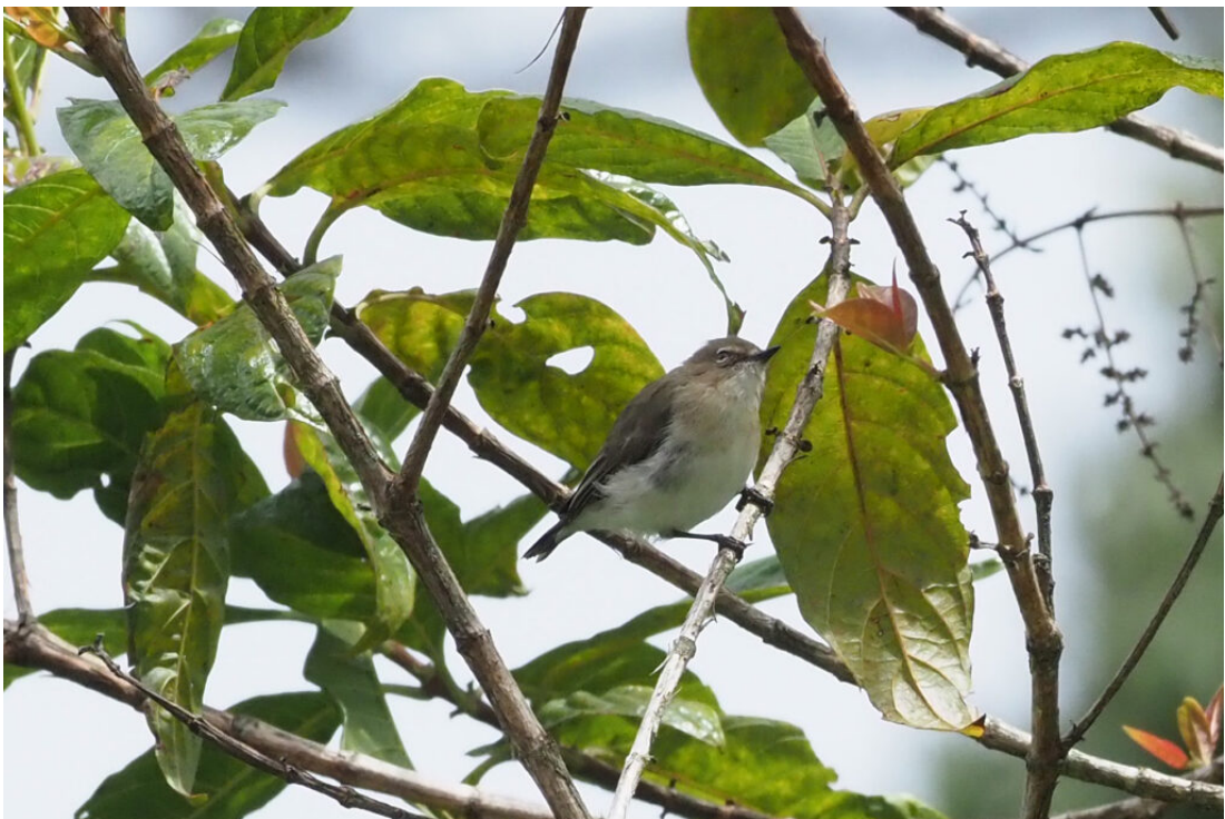
Brown-breasted Gerygone