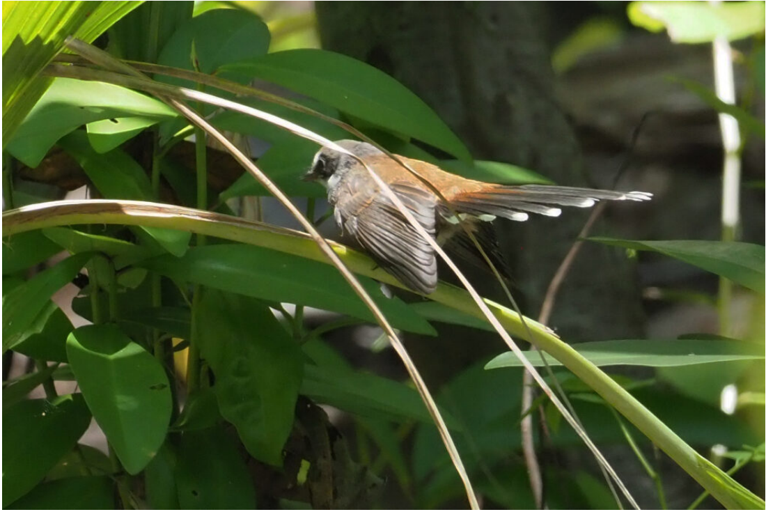
Arafura Fantail