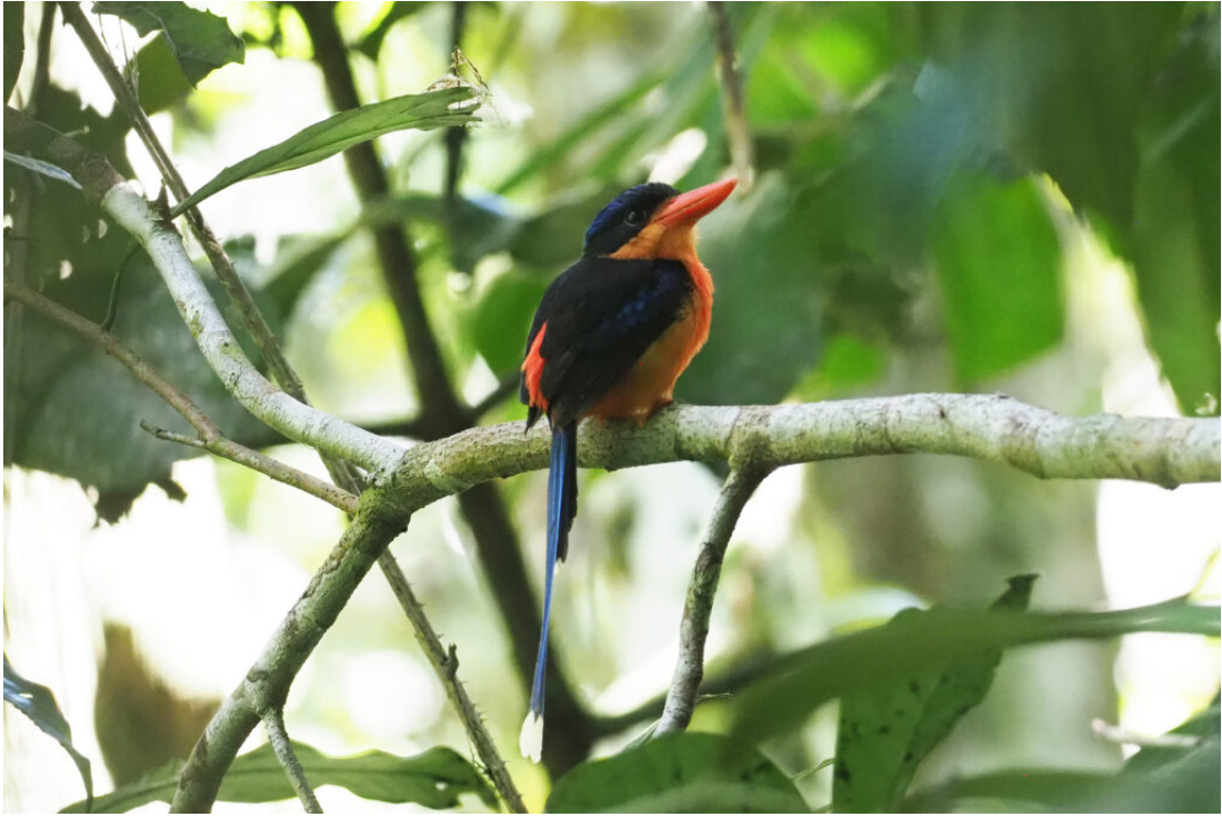
Red-breasted Paradise Kingfisher