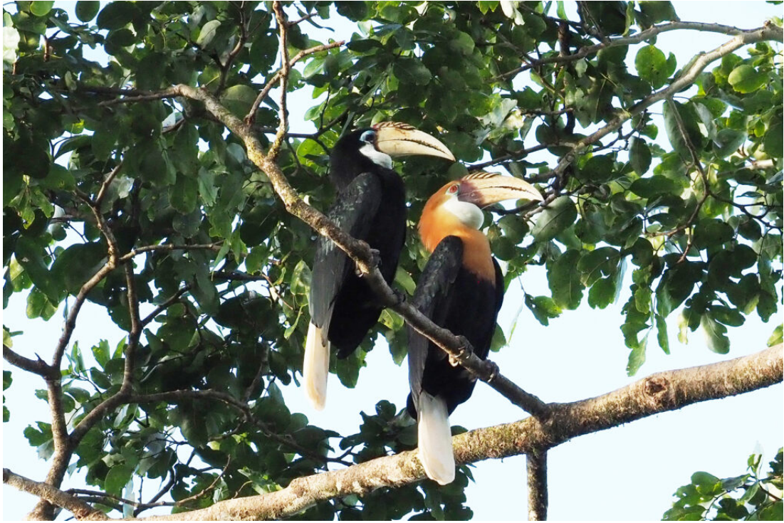
Blyth's Hornbill