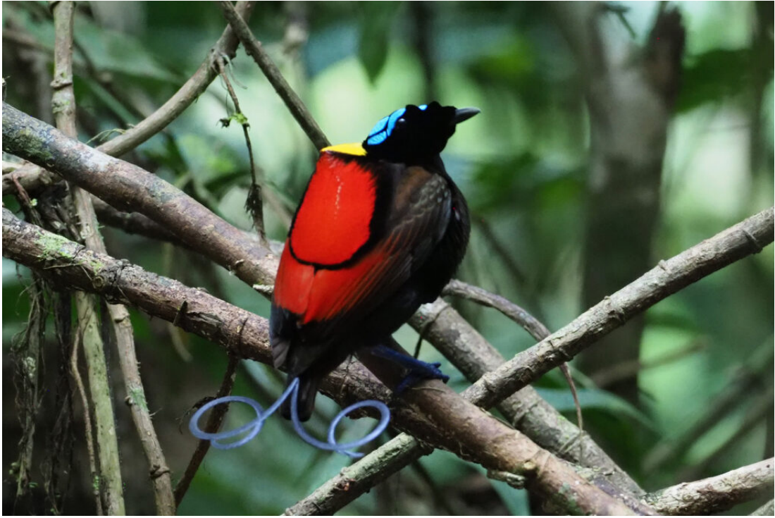
Wilson's Bird-of-paradise