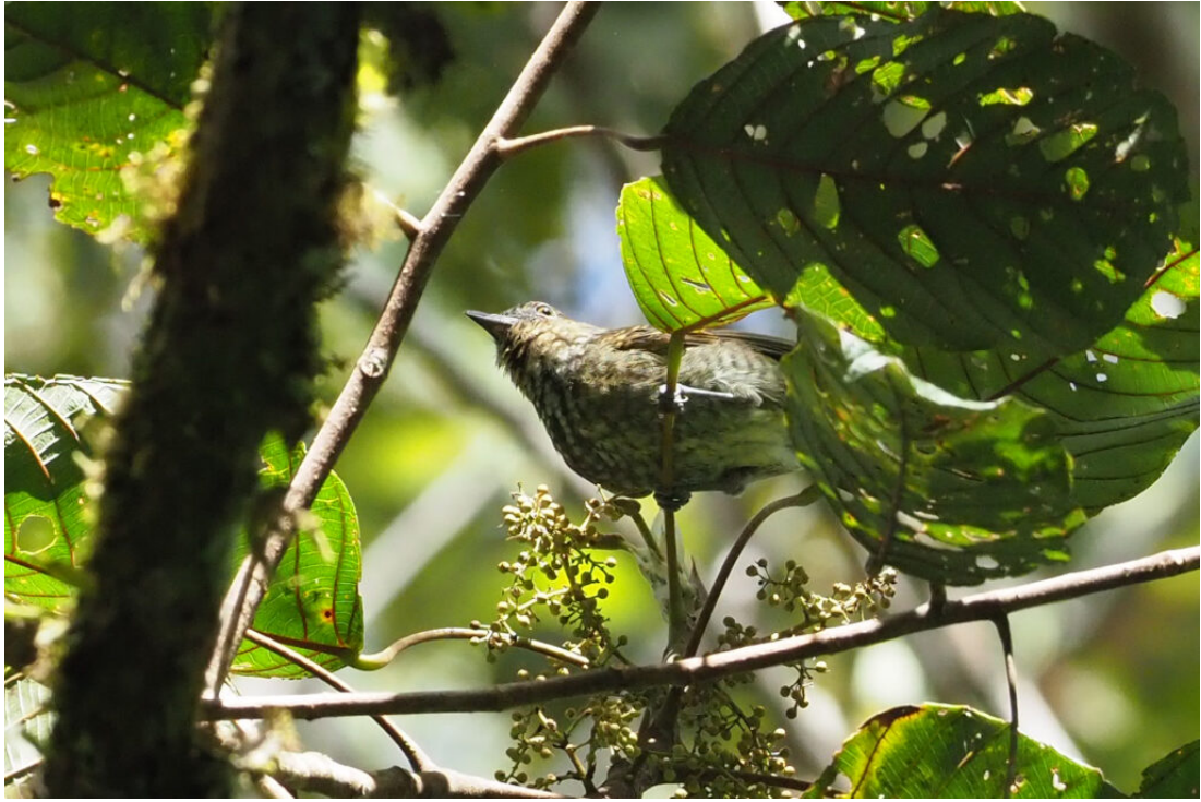
Mottled Berryhunter