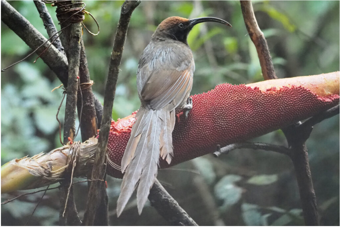
female Black Sicklebill