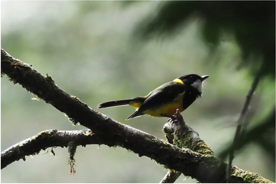
Regent Whistler