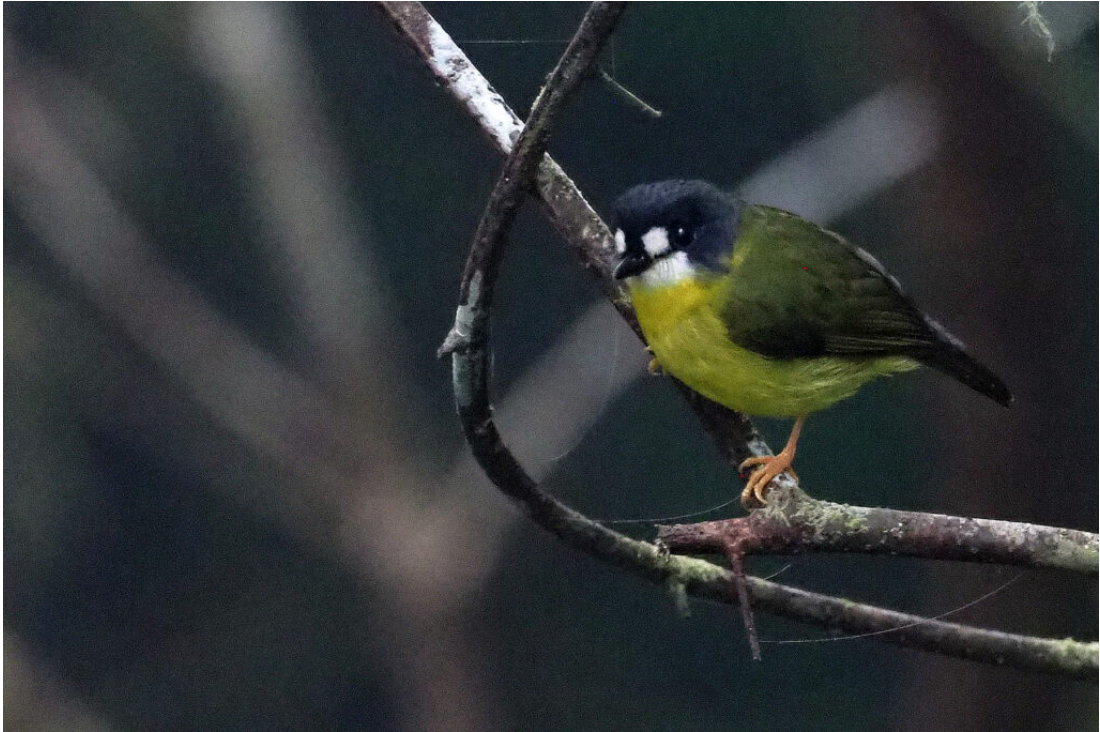
White-faced Robin