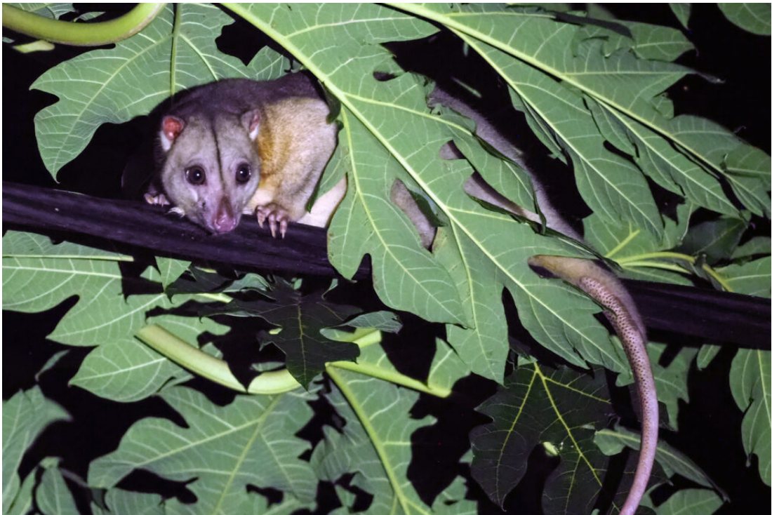
Northern Common Cuscus