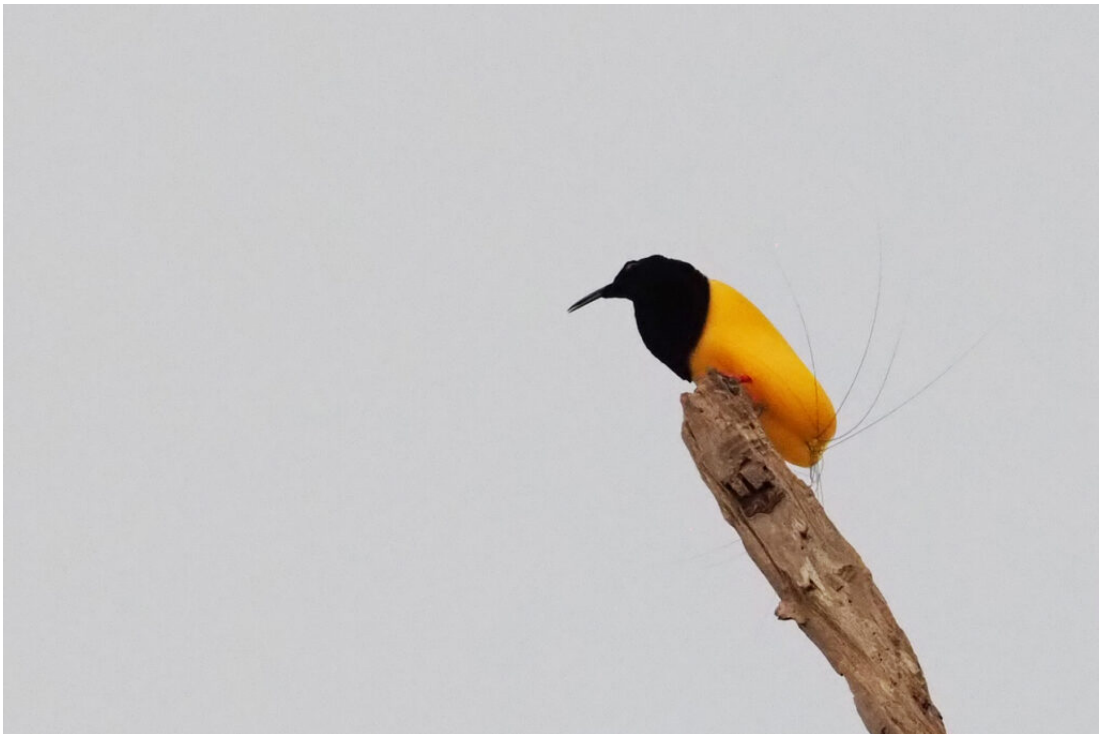
Twelve-wired Bird-of-paradise