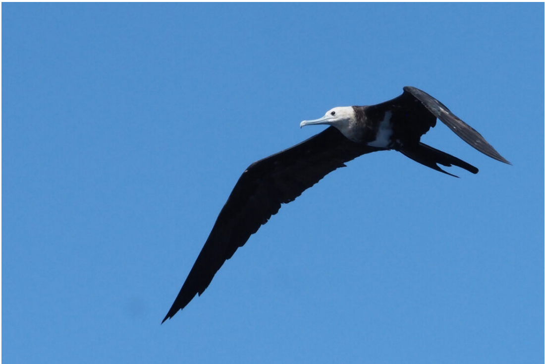
Lesser Frigatebird