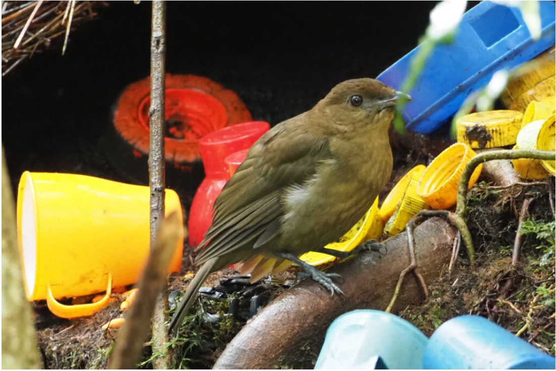
Vogelkop Bowerbird