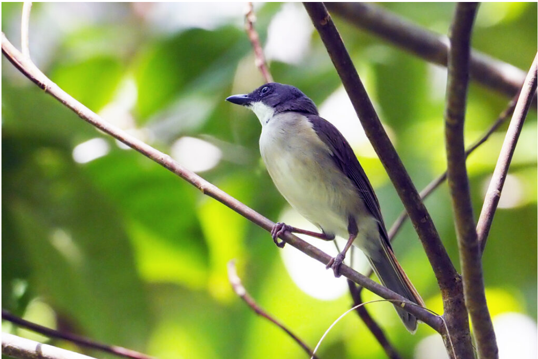
Island Whistler