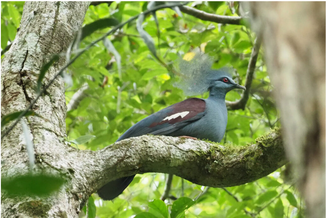
Western Crowned Pigeon