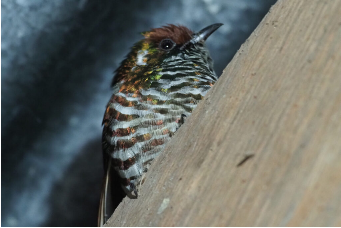
White-eared Bronze Cuckoo