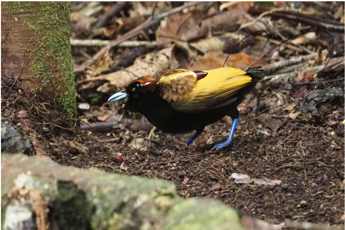
Magnificent Bird-of-paradise