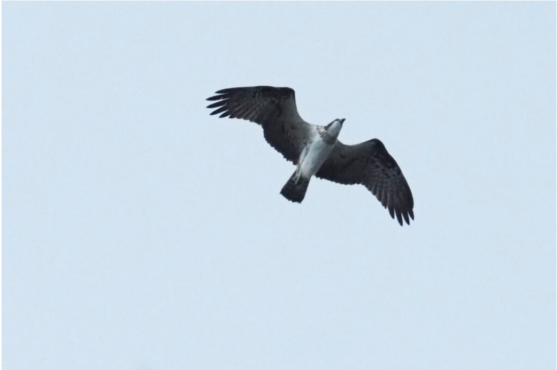
Osprey