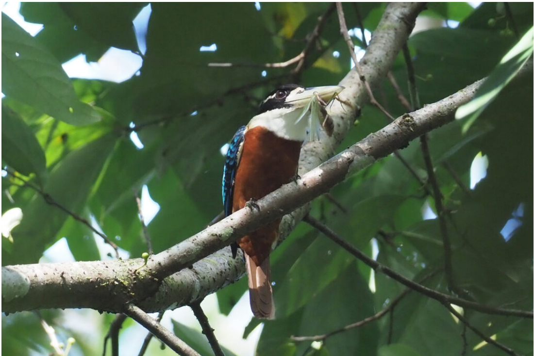
Rufous-bellied Kookaburra