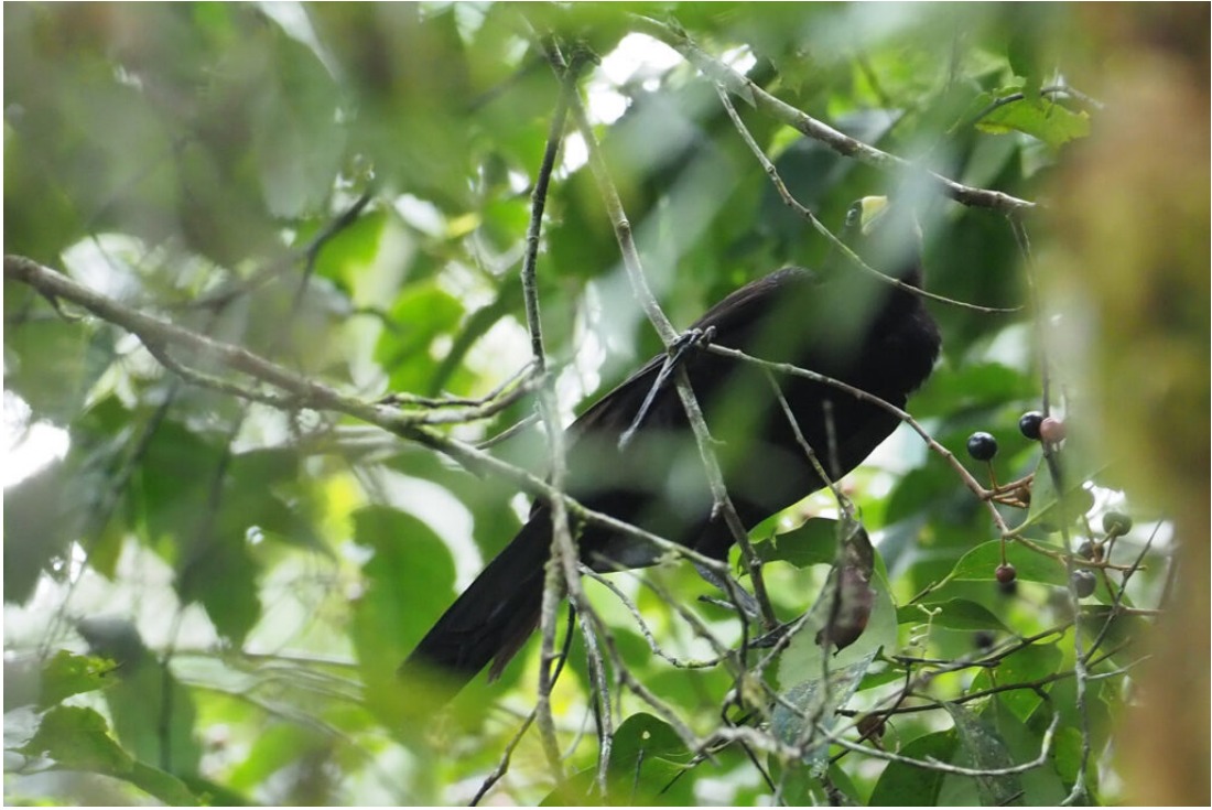
Long-tailed Paradigalla