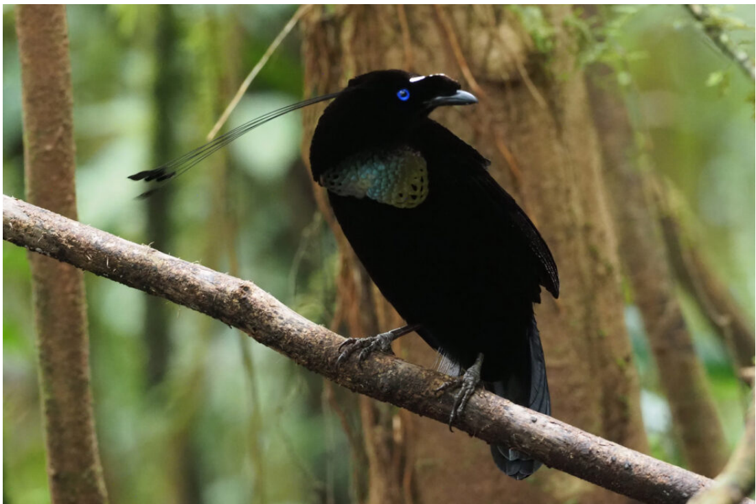
Western Parotia