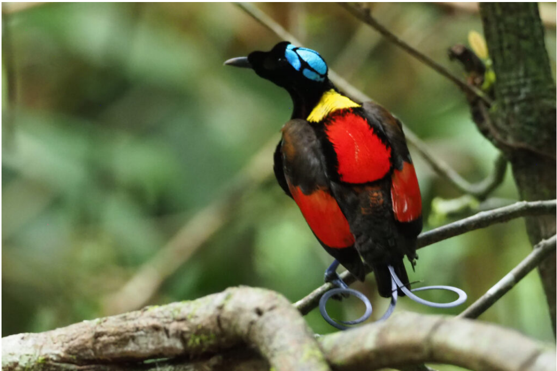
Wilson's Bird-of-paradise