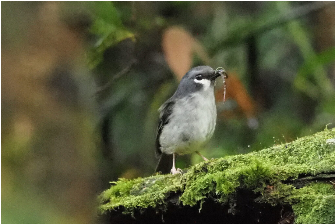
Ashy Robin