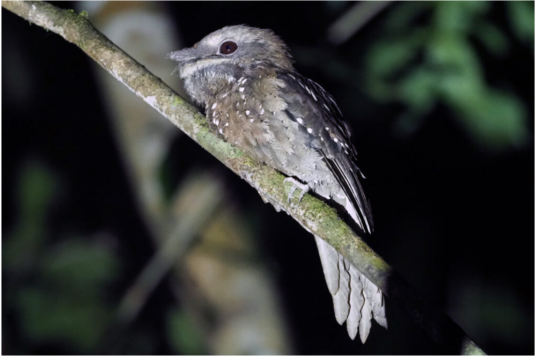
Marbled Frogmouth