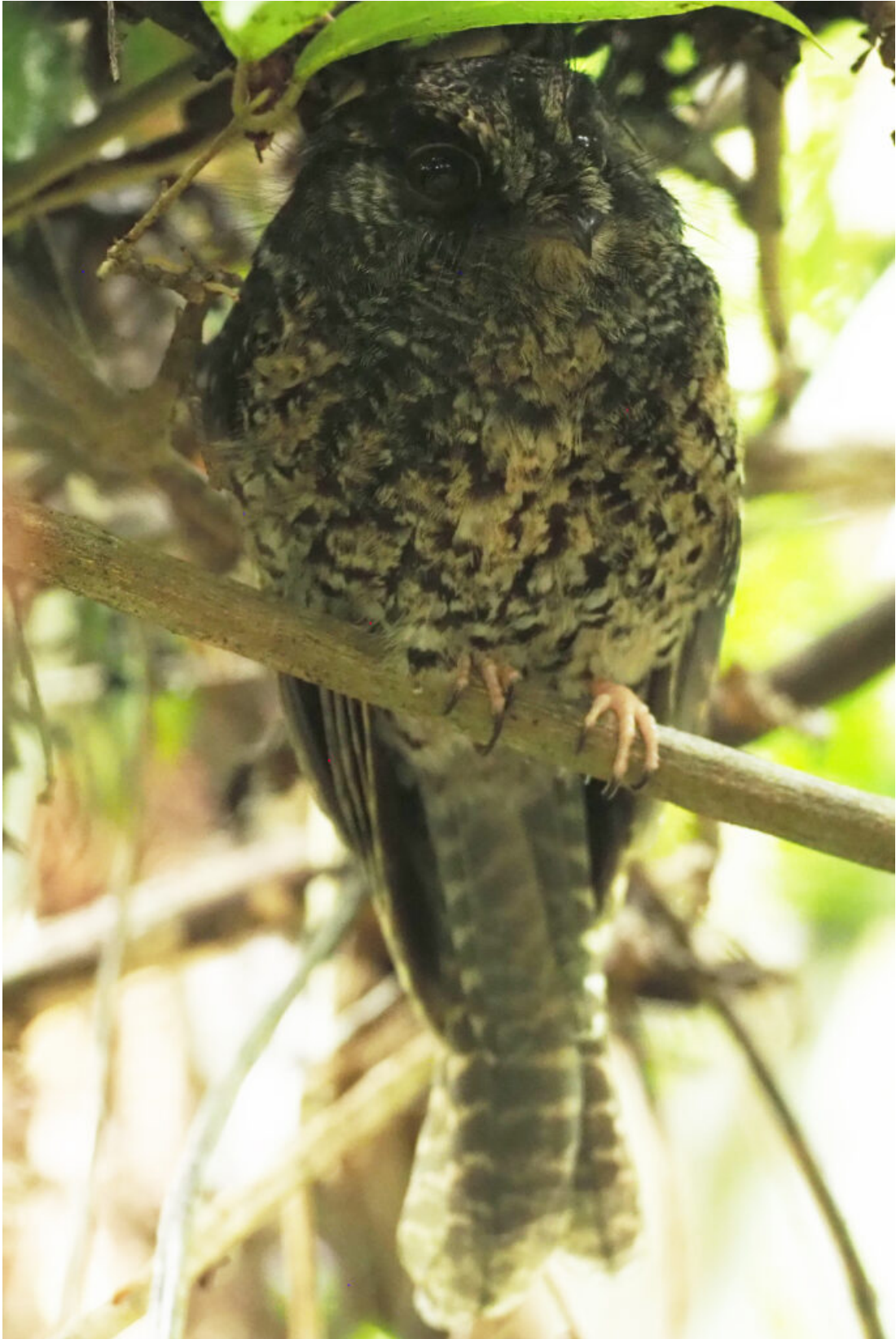
Mountain Owlet-Nightjar