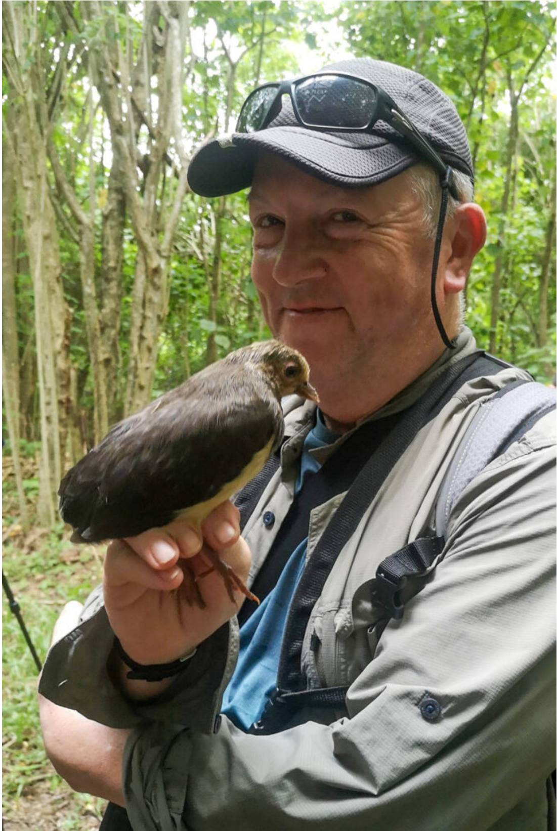
Tour leader with Maleo chick