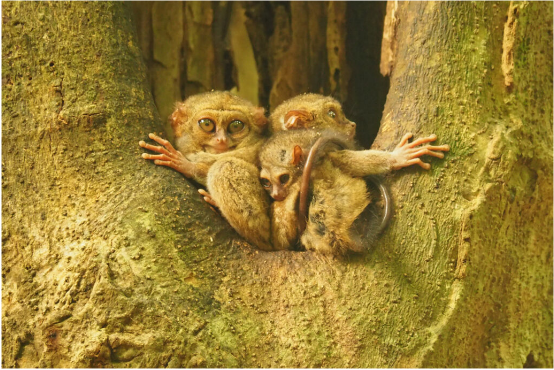
Spectral Tarsier