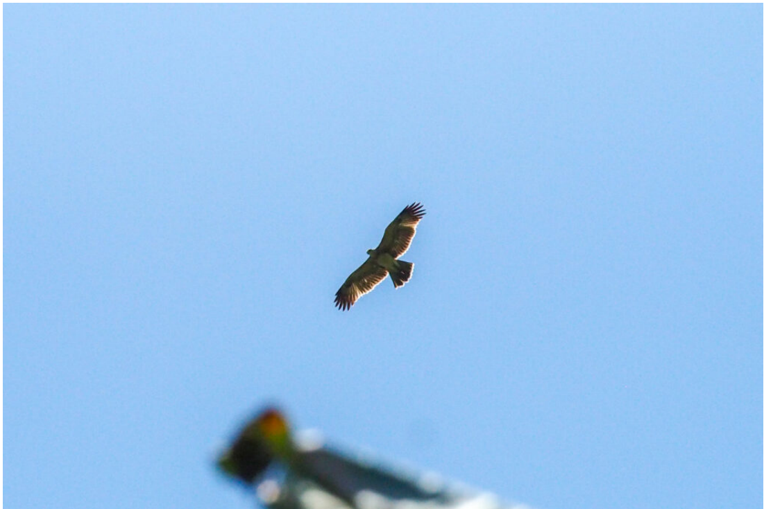
Gurney's Eagle