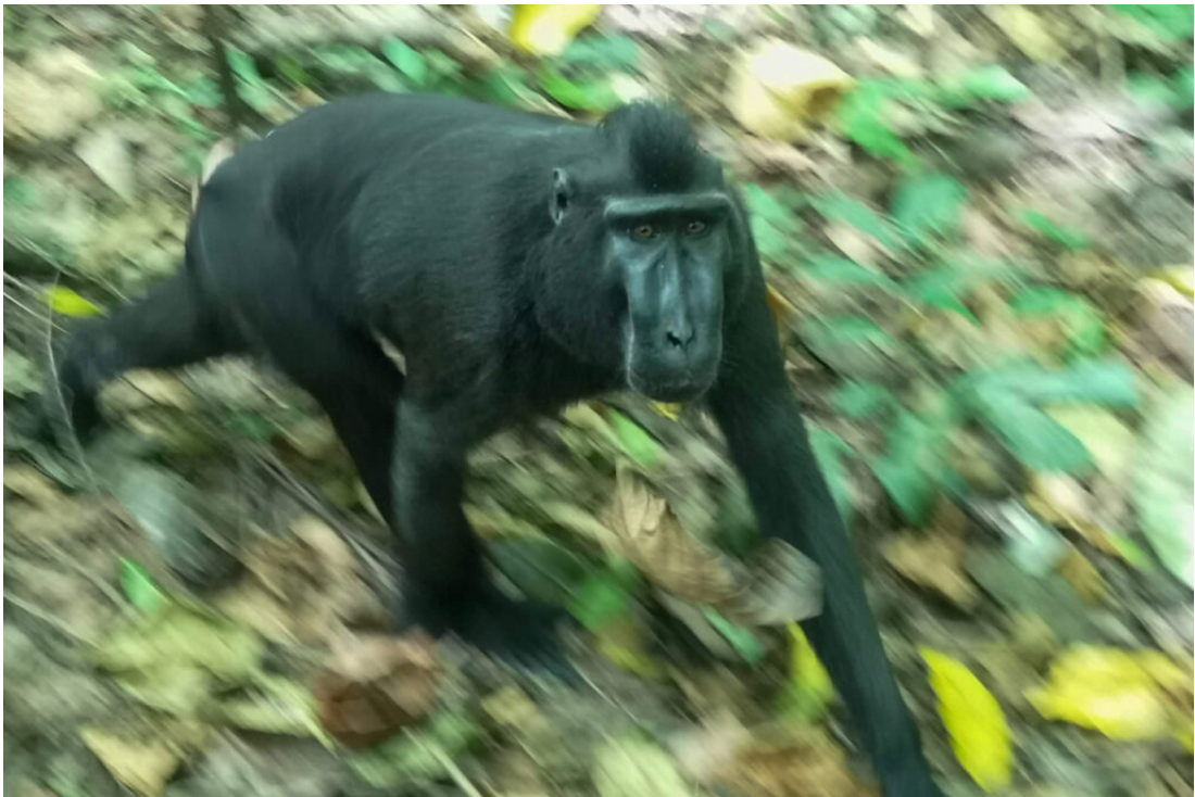
Celebes Crested Macaque