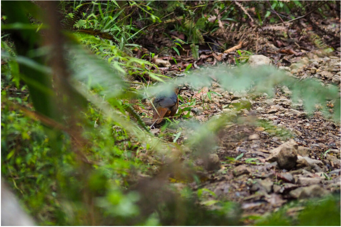
Geomalia