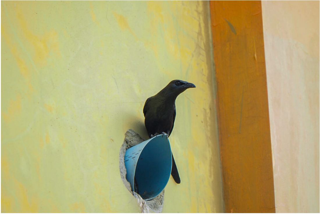
Moluccan Starling