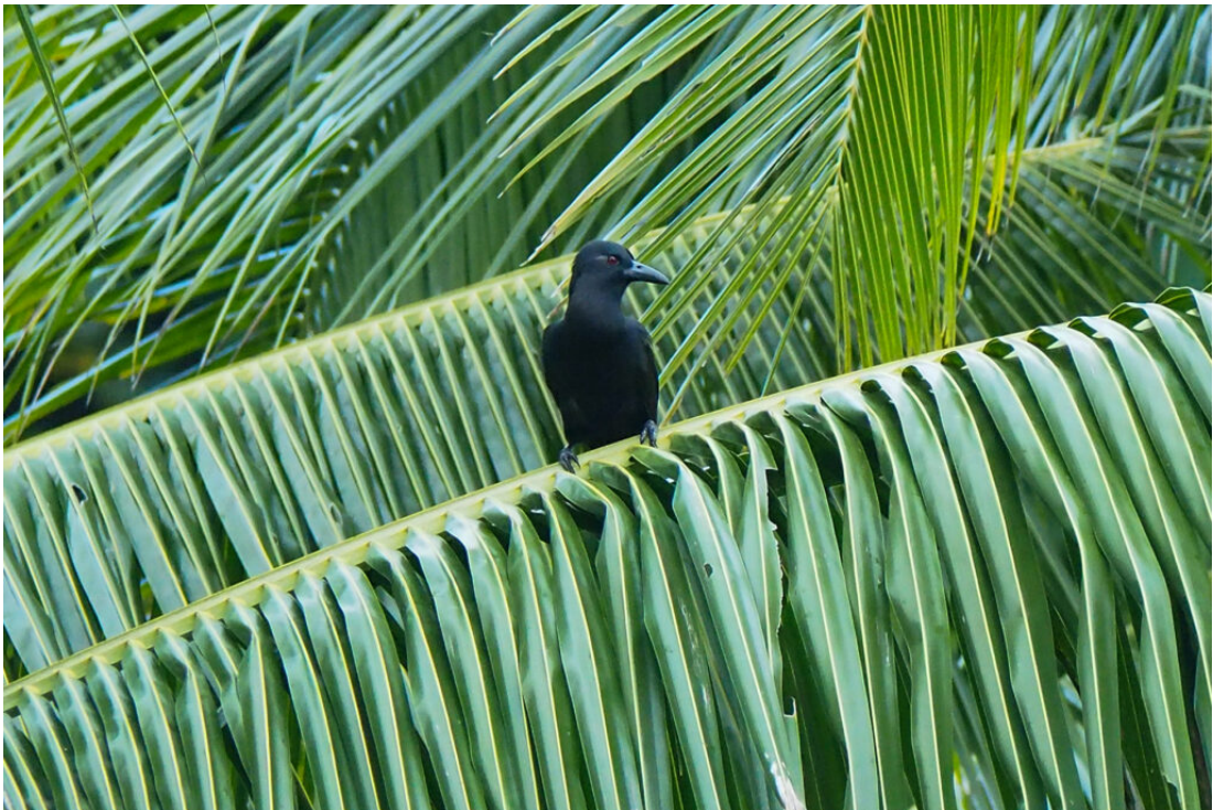
Obi Paradise Crow