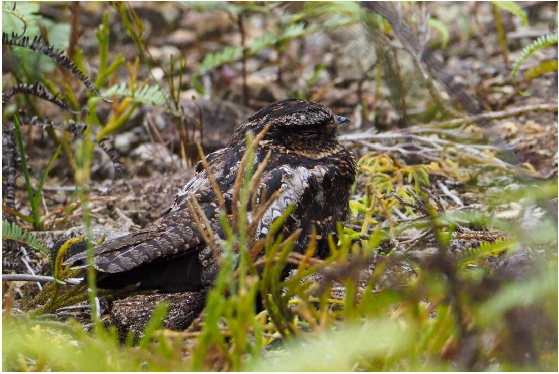
Satanic Nightjar