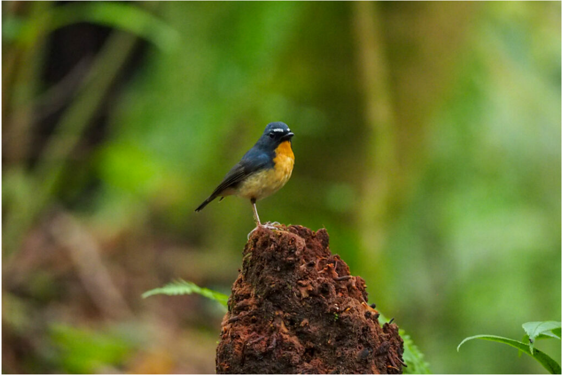
Snowy-browed Flycatcher