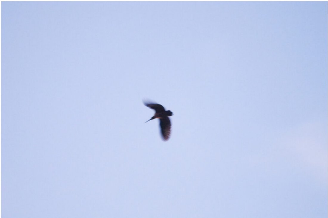
Moluccan Woodcock