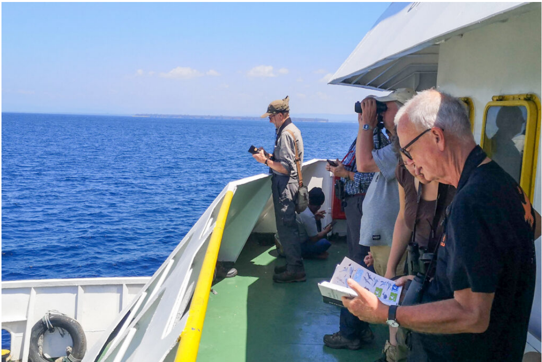
The ferry to Subaim