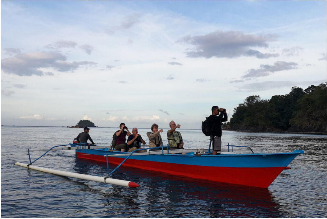
Watching Great-billed Kingfisher