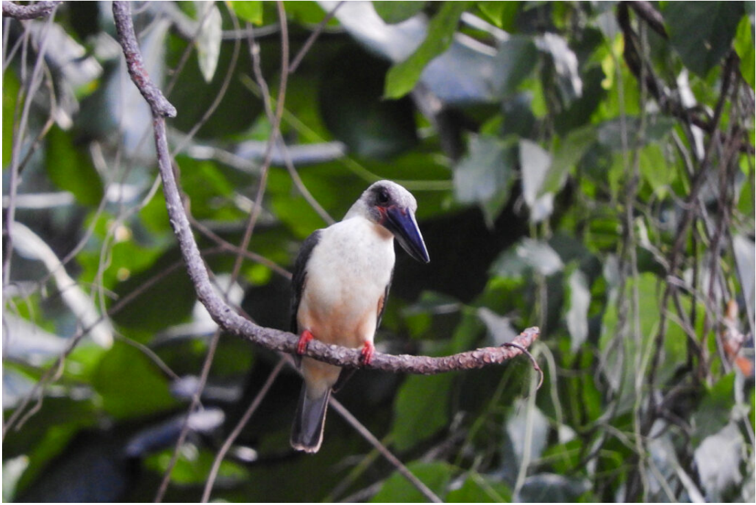
Great-billed Kingfisher