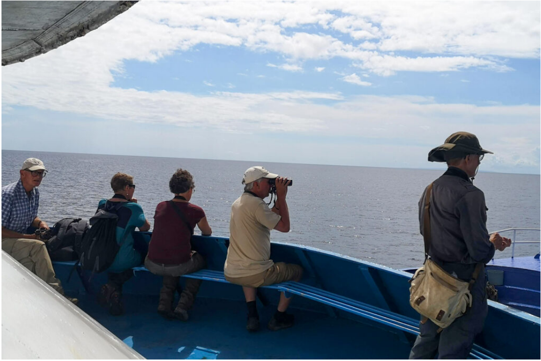
Cruising to Obi