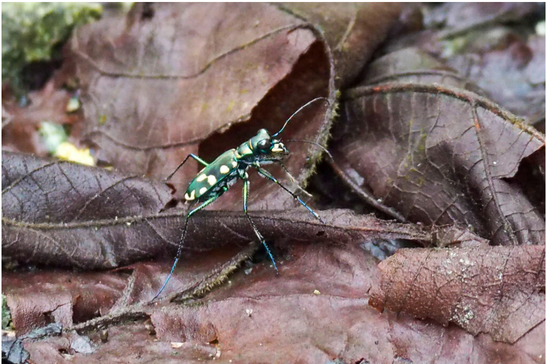
Tiger Beetle sp