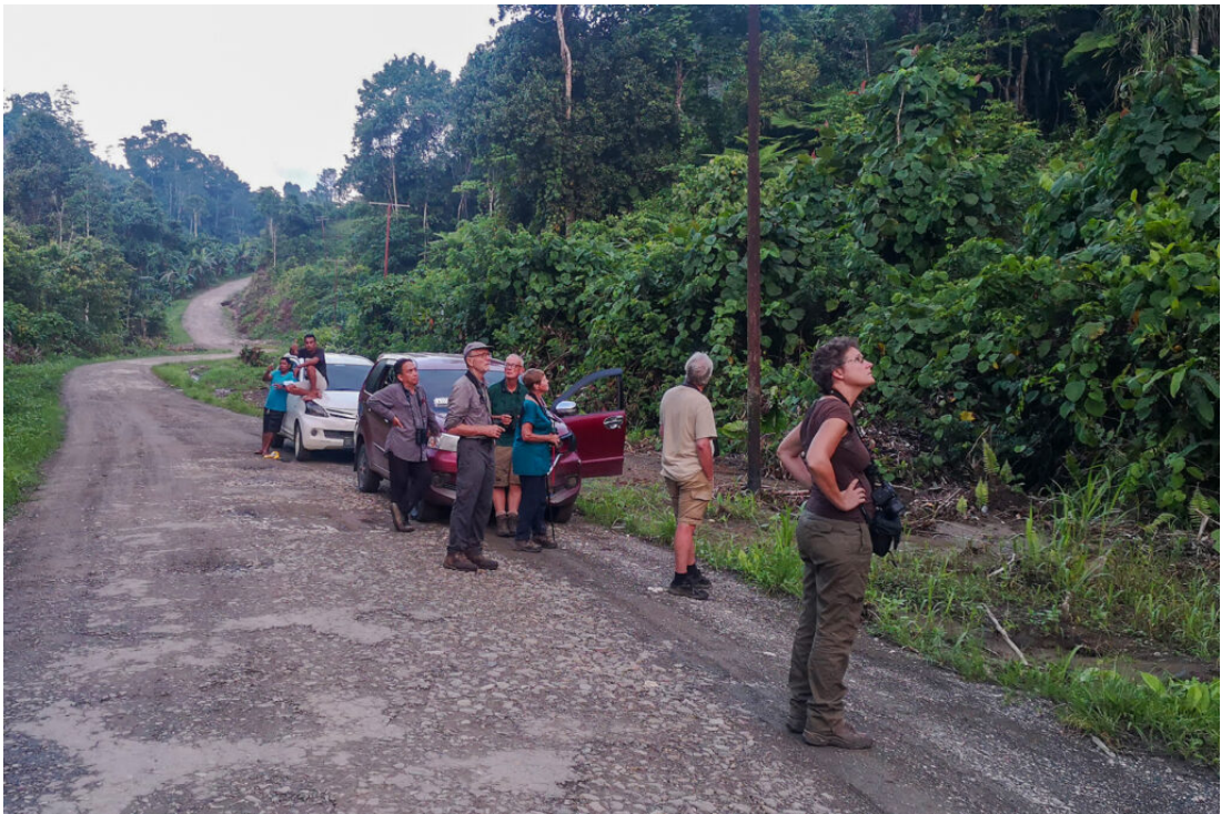
Waiting for the Woodcock