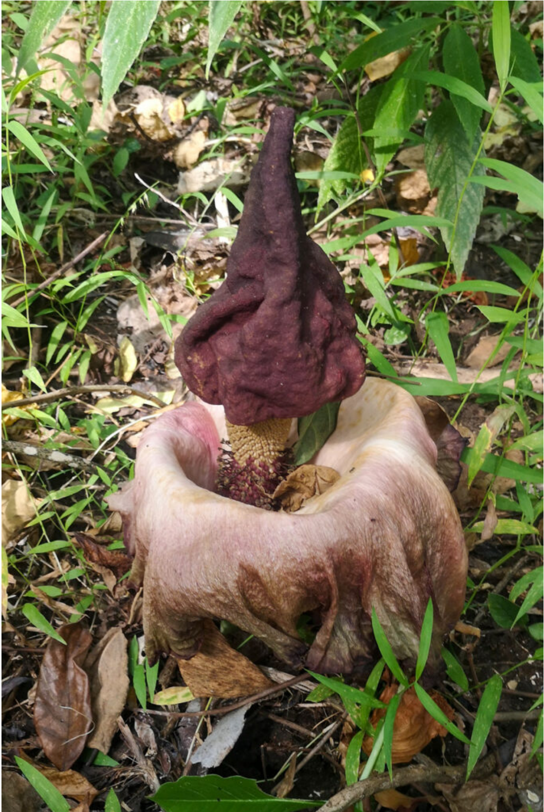
Amorphophallus paeoniifolius