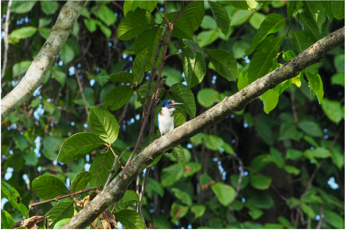
juvenile Blue-and-white Kingfisher