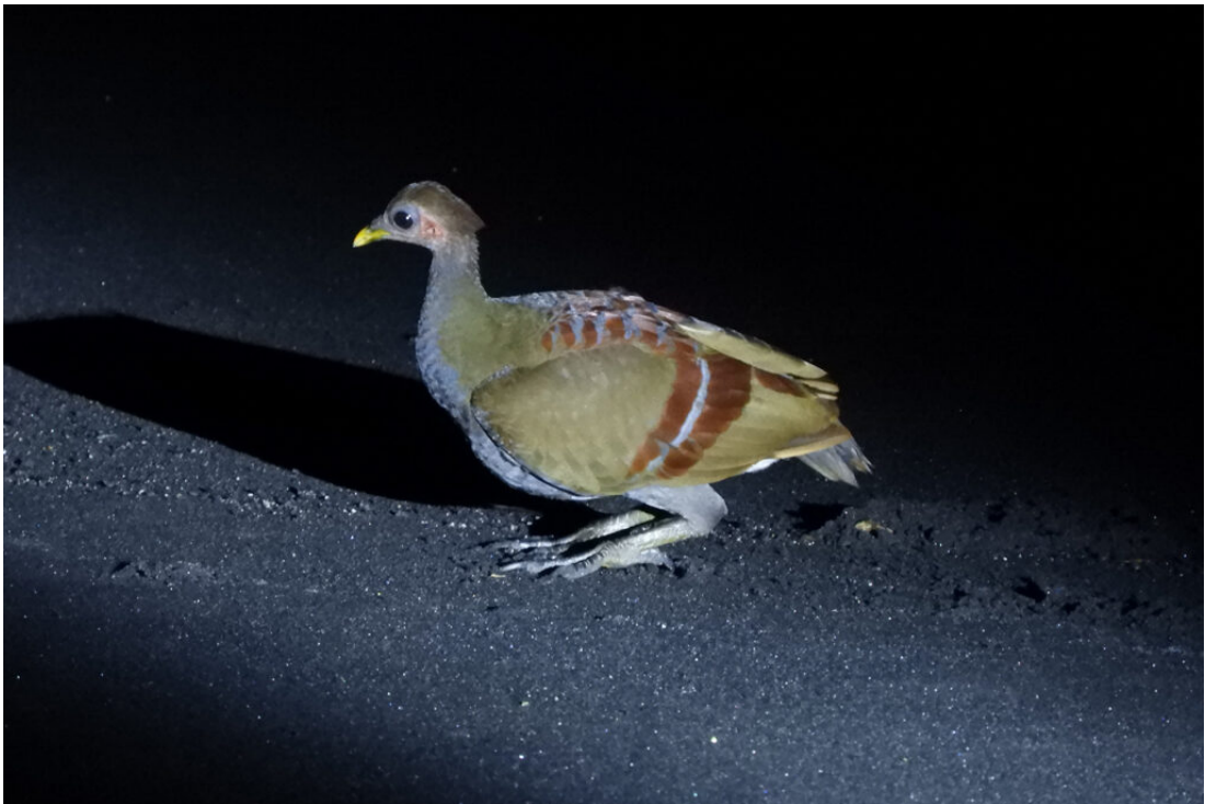
Moluccan Megapode