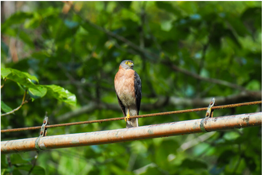
Rufous-necked Sparrowhawk