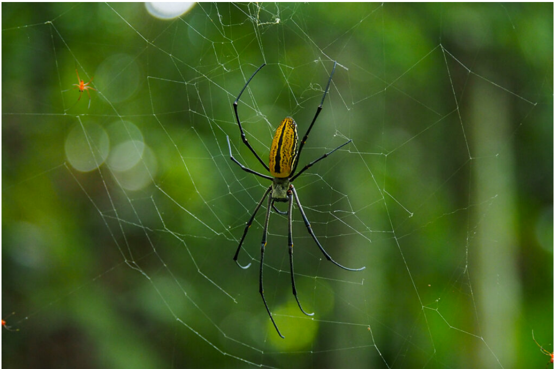
Giant Golden Orbweaver