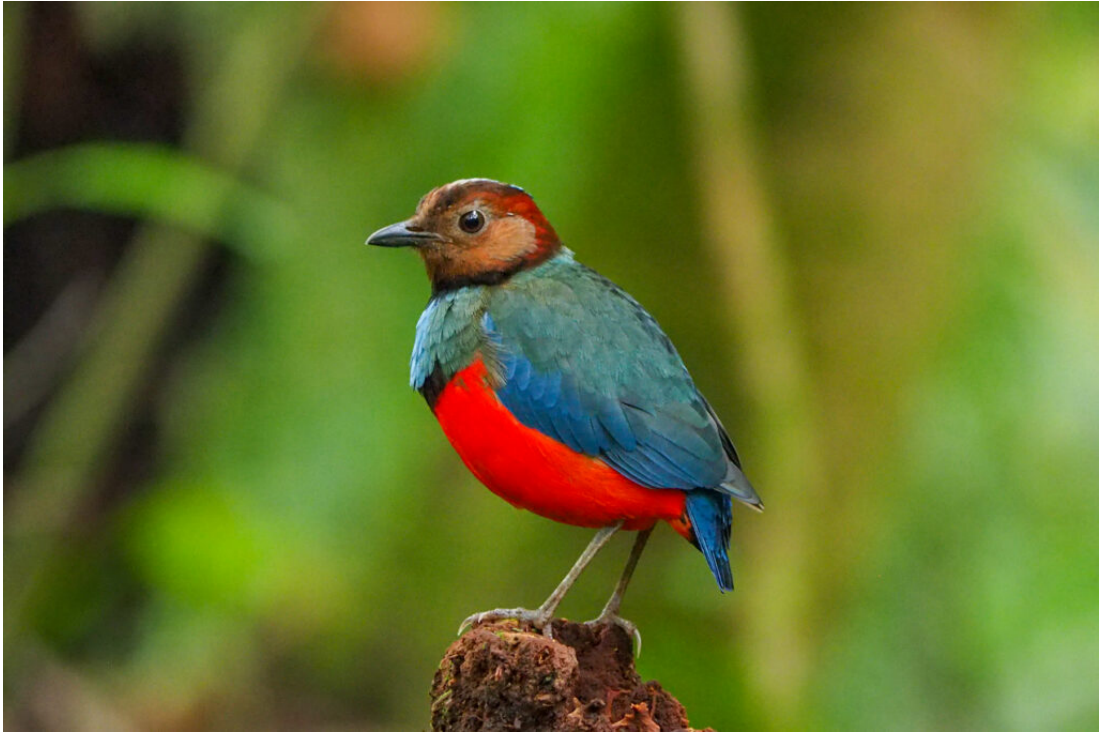
Sulawesi Pitta