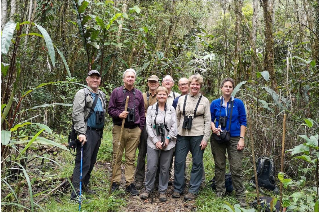
Happy group at the Anaso Track