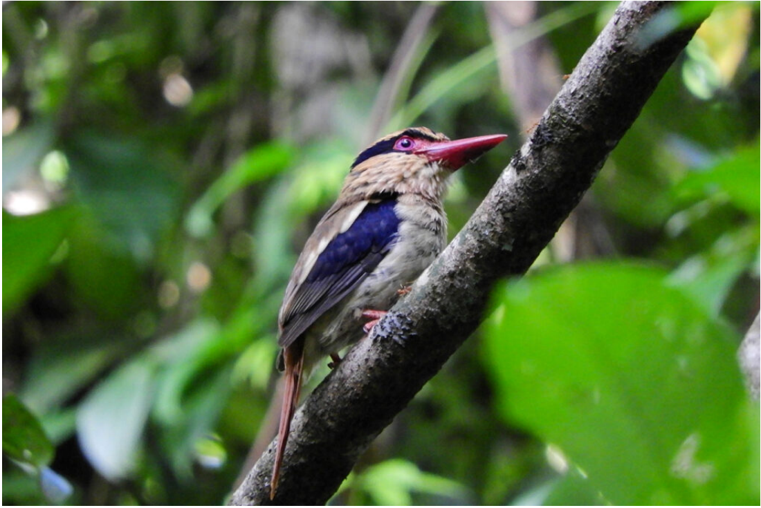
Sulawesi Lilac Kingfisher