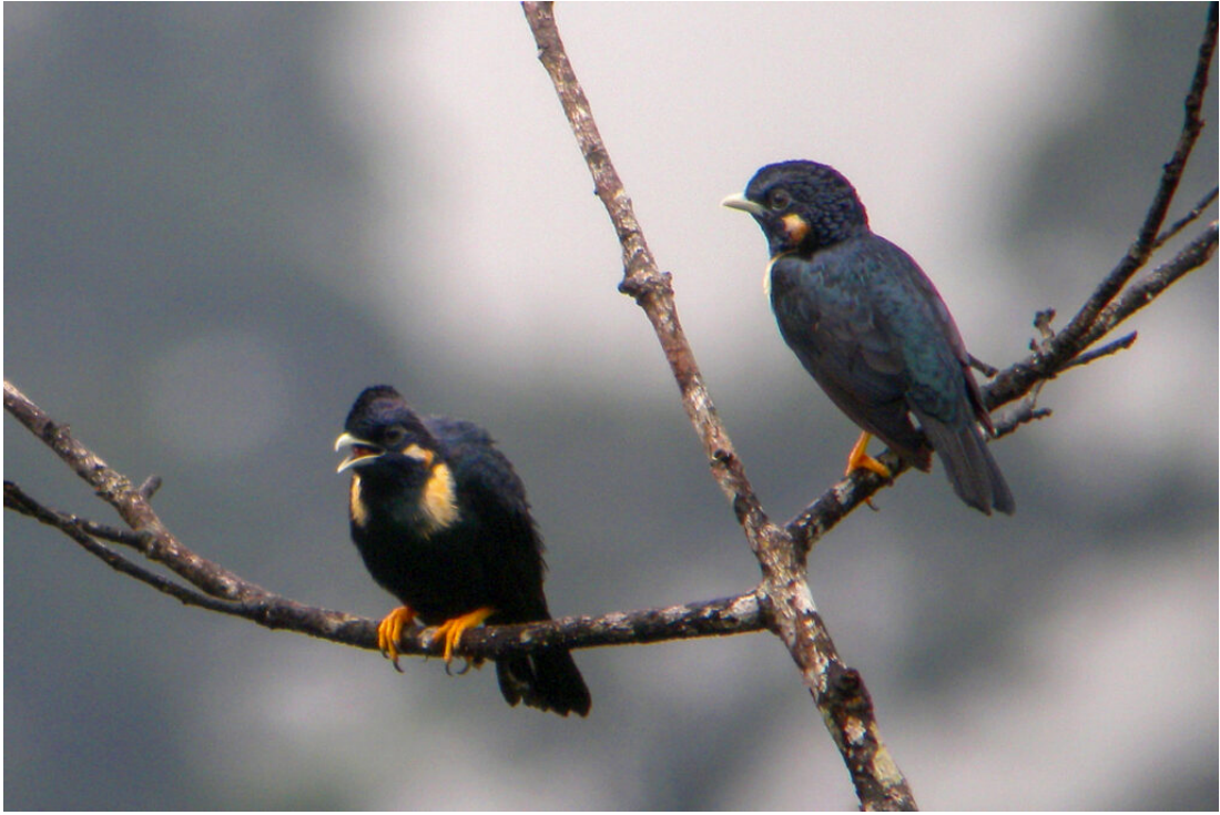
Short-crested Myna