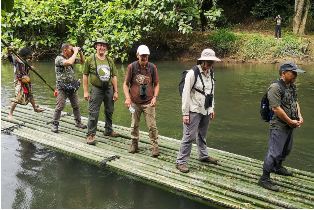
Raft at Toraut