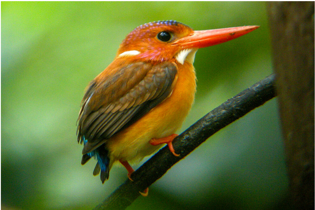
Sulawesi Dwarf Kingfisher