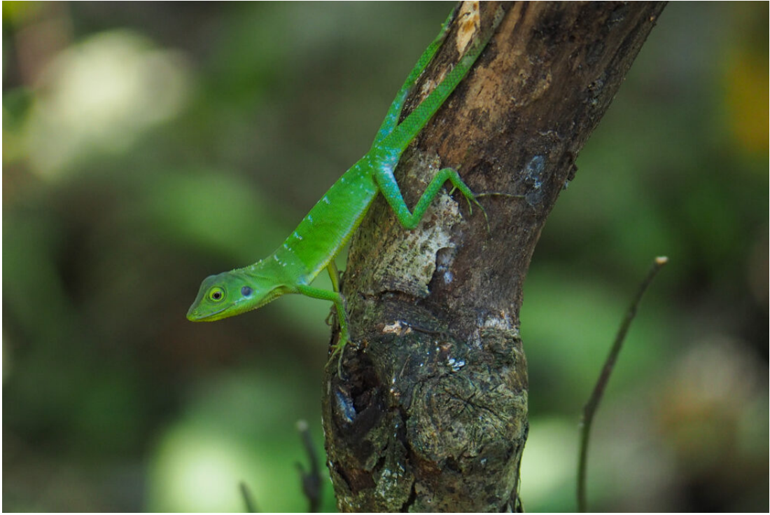
Lizard sp