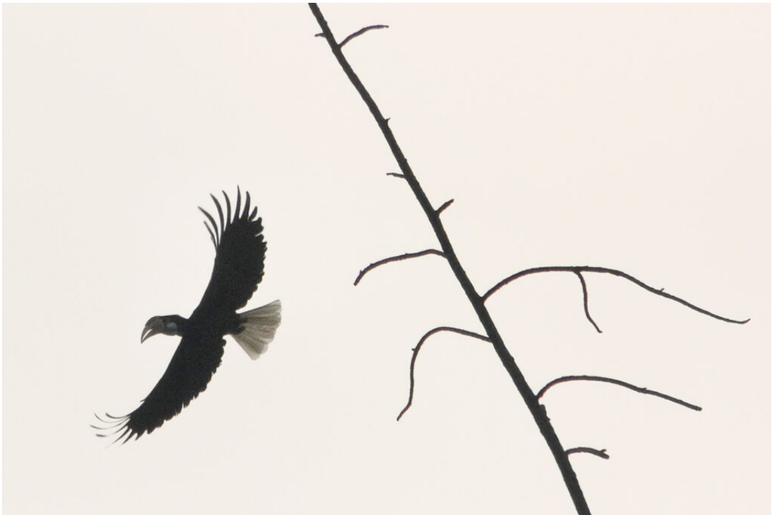
Blyth's Hornbill