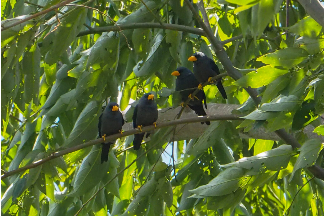
Grosbeak Starlings