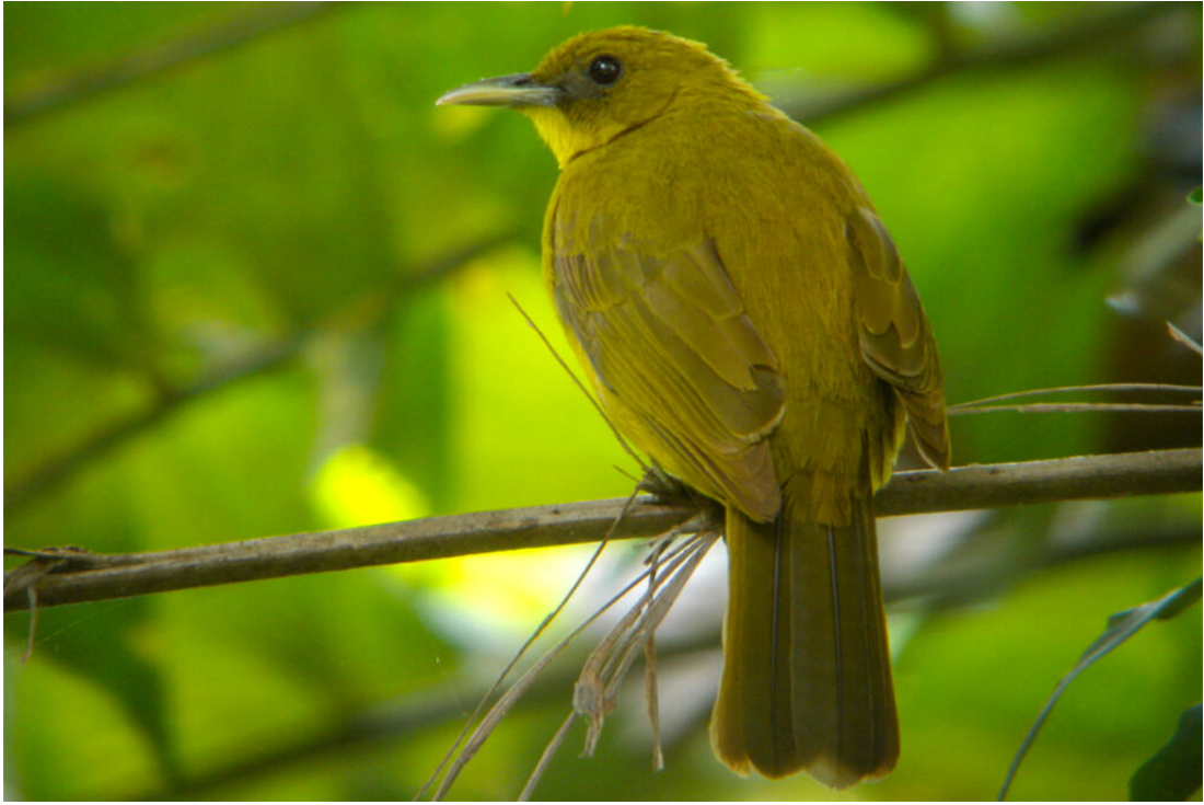
Northern Golden Bulbul