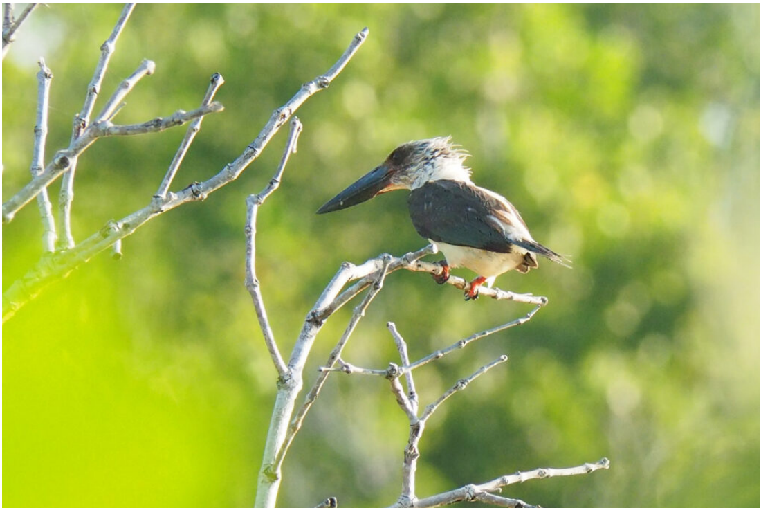
Great-billed Kingfisher