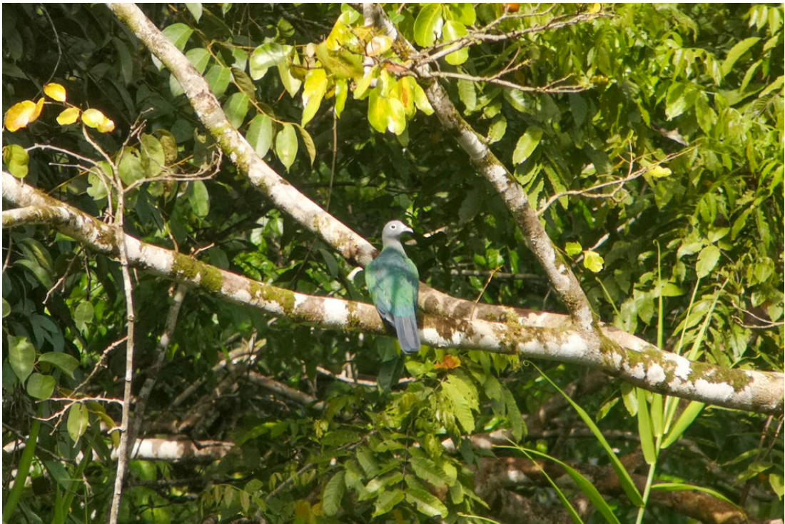
Spectacled Imperial Pigeon