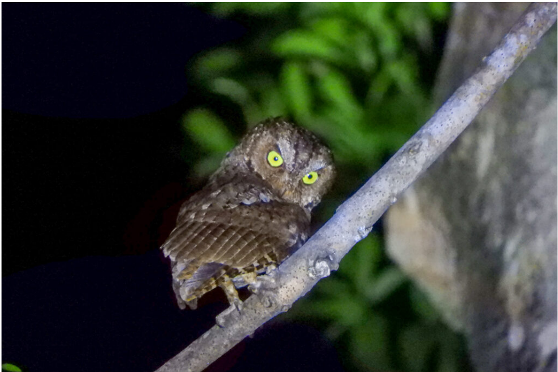
Sulawesi Scops Owl