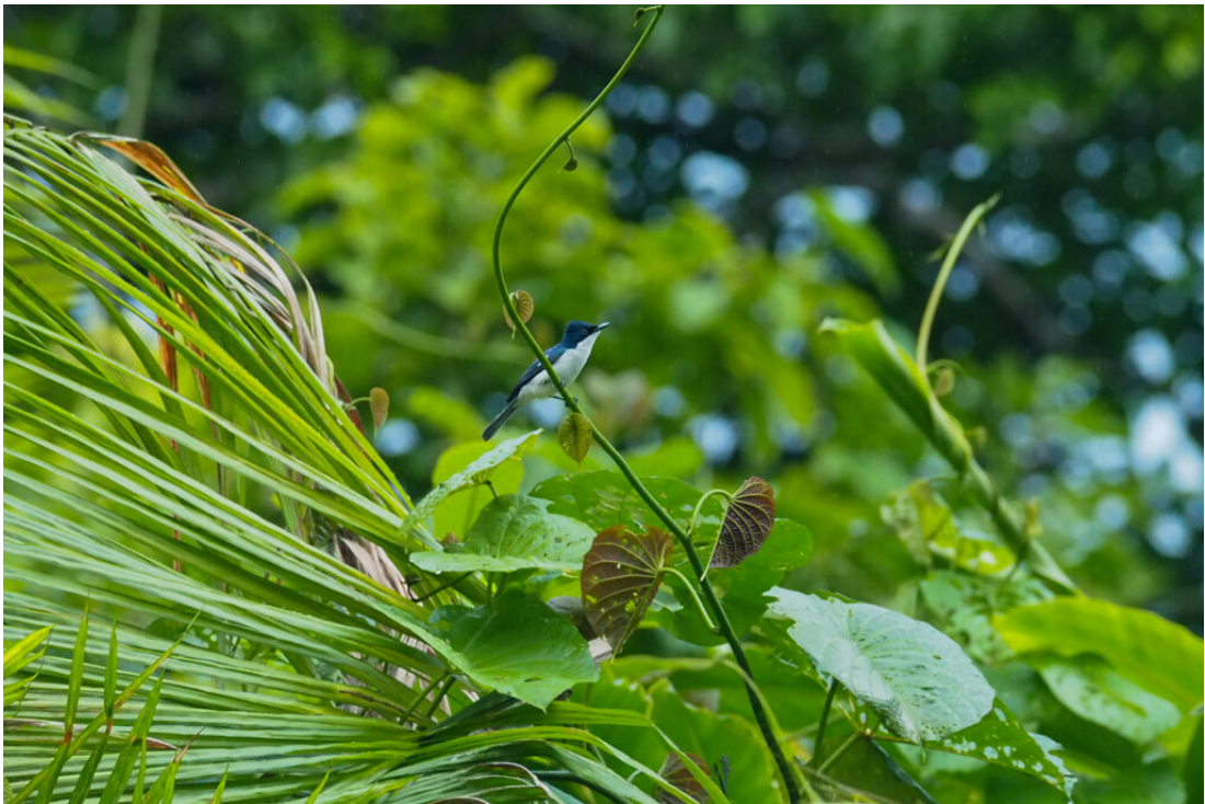
Slaty Flycatcher