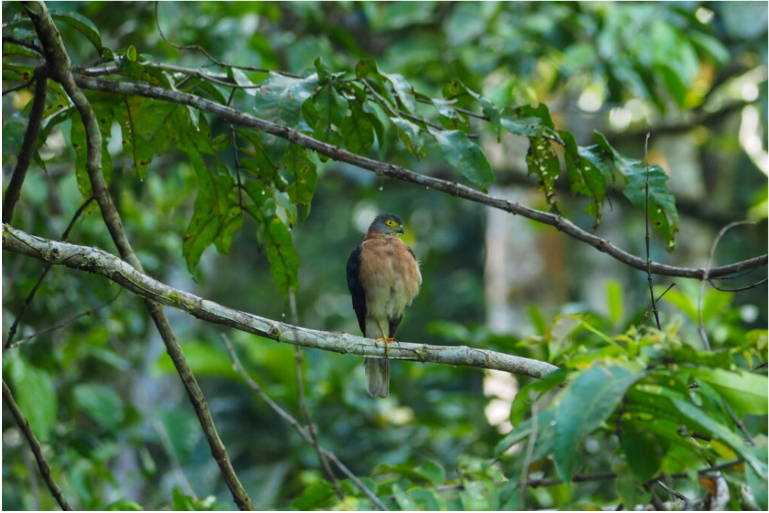
Rufous-necked Sparrowhawk