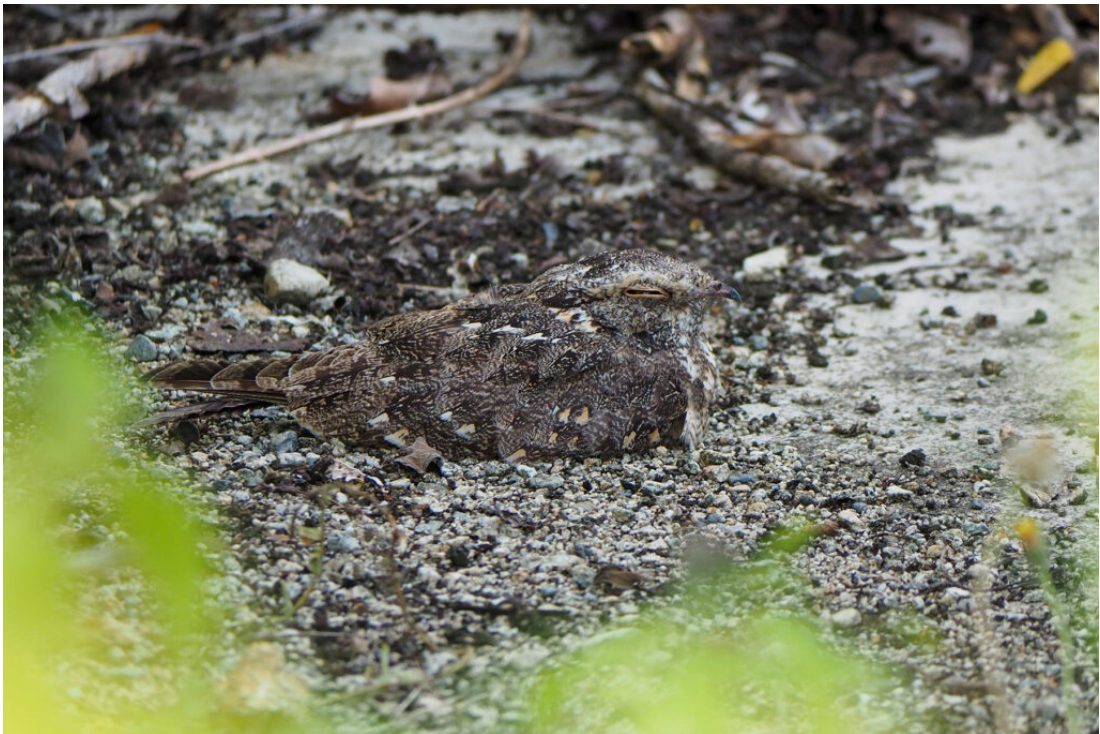
Savanna Nightjar