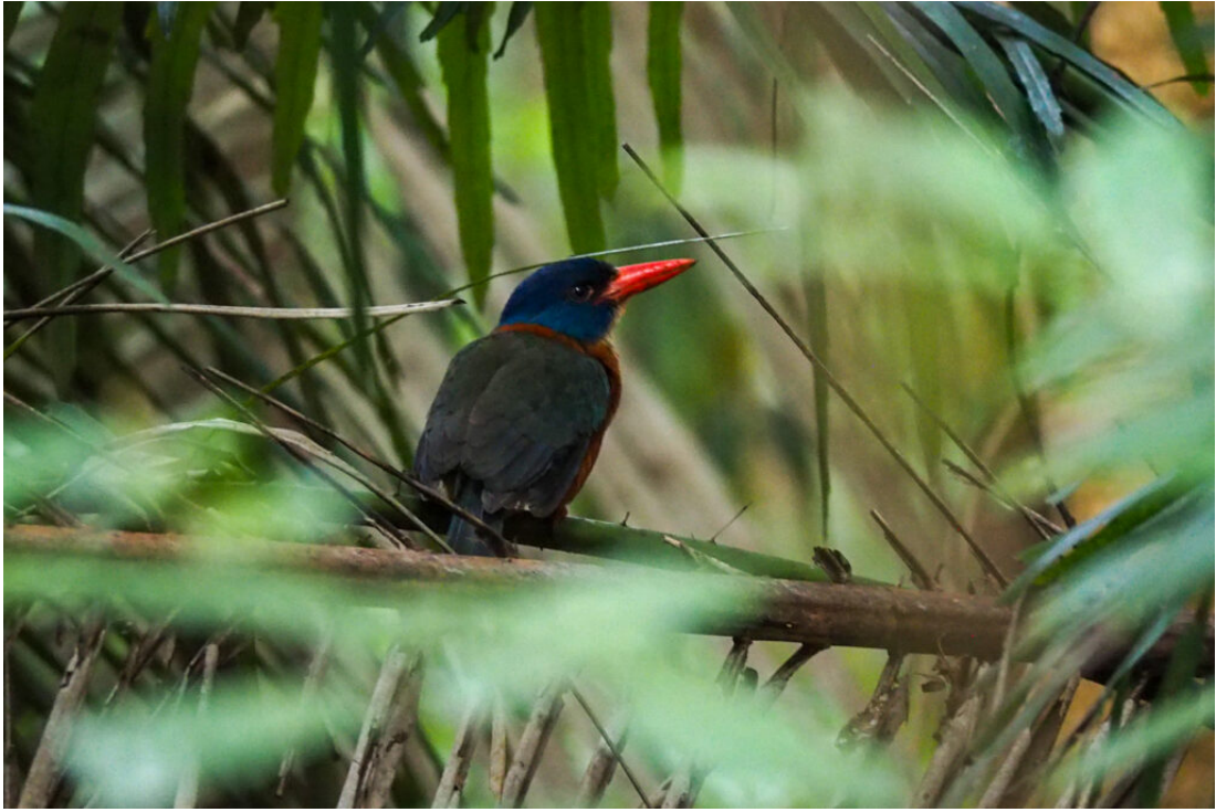
male Green-backed Kingfisher