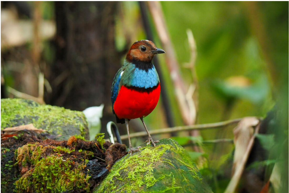
Sulawesi Pitta