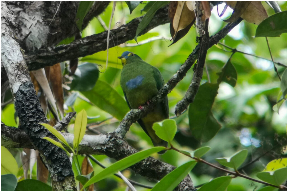
Blue-capped Fruit Dove