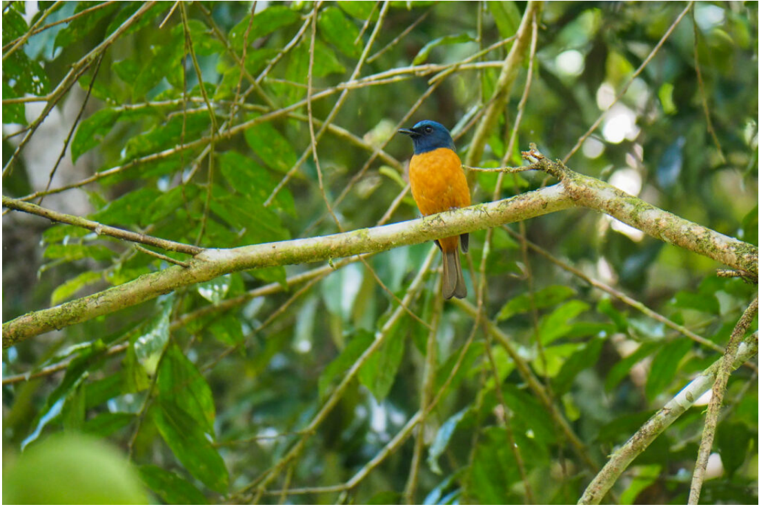
Blue-fronted Flycatcher