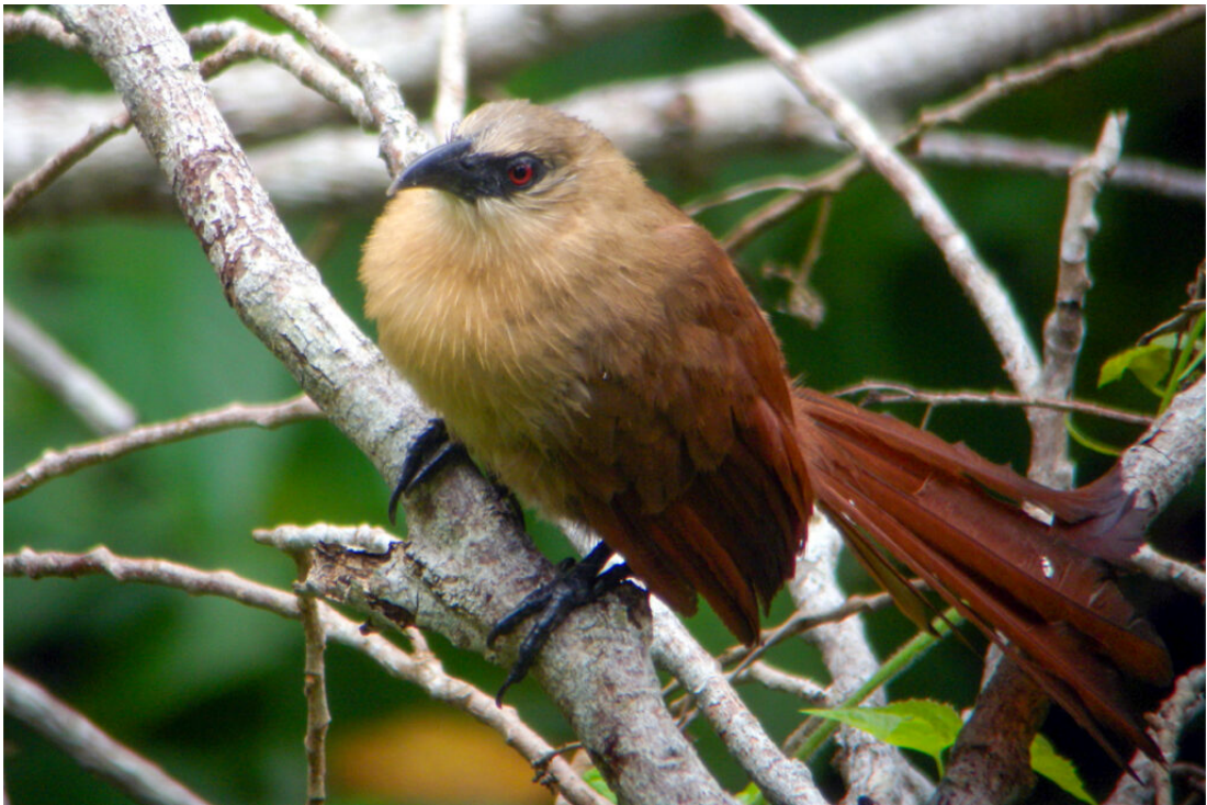
Bay Council