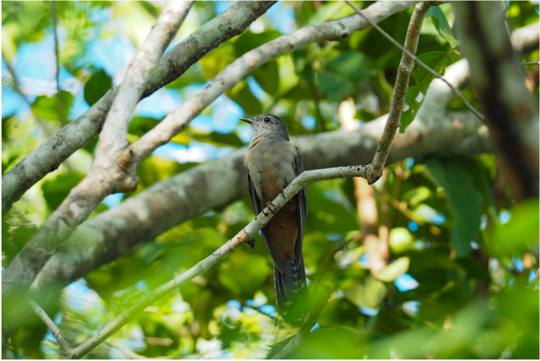
Brush Cuckoo