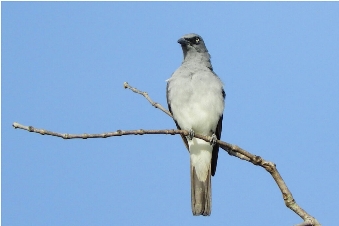
White-rumped Cuckooshrike

North Sulawesi Tree Squirrel Prosciurillus murinus The widespread little one.