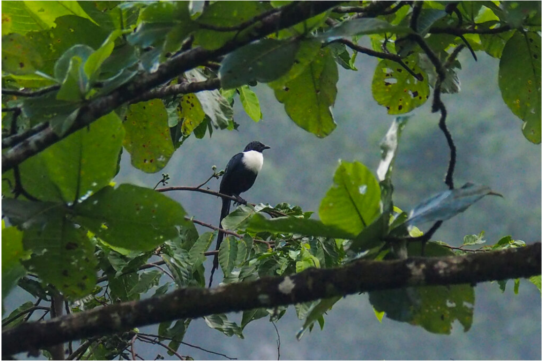
White-necked Myna