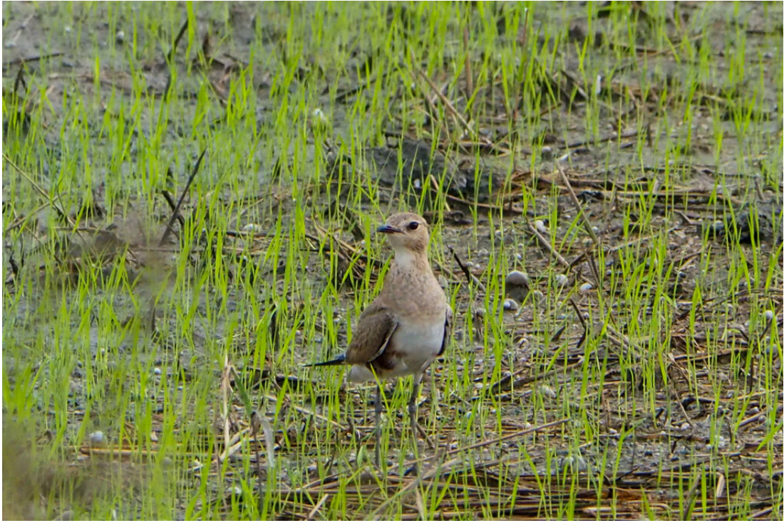
Australian Pratincole