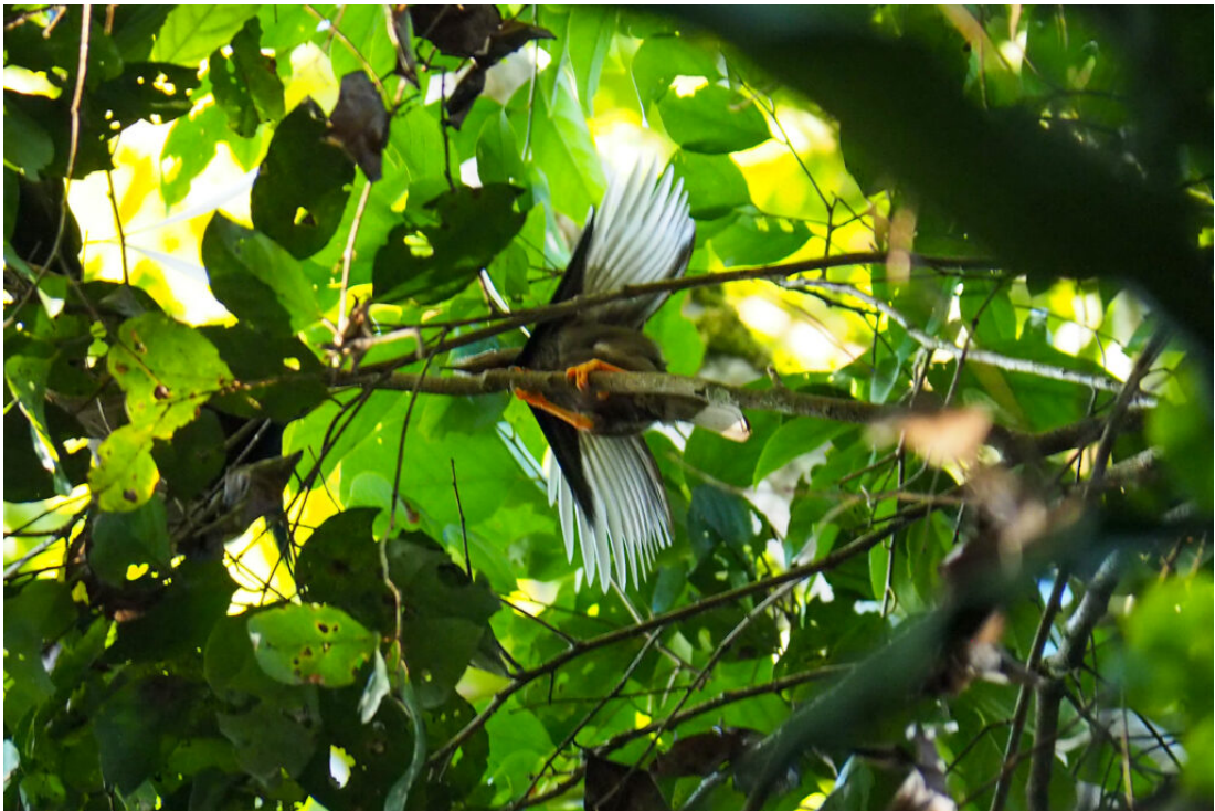
Standardwing (image by Dave Farrow)