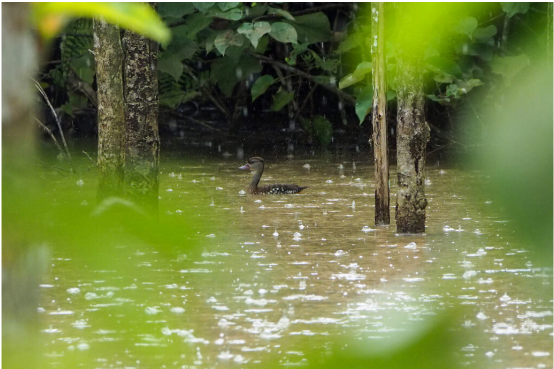
Spotted Whistling Duck