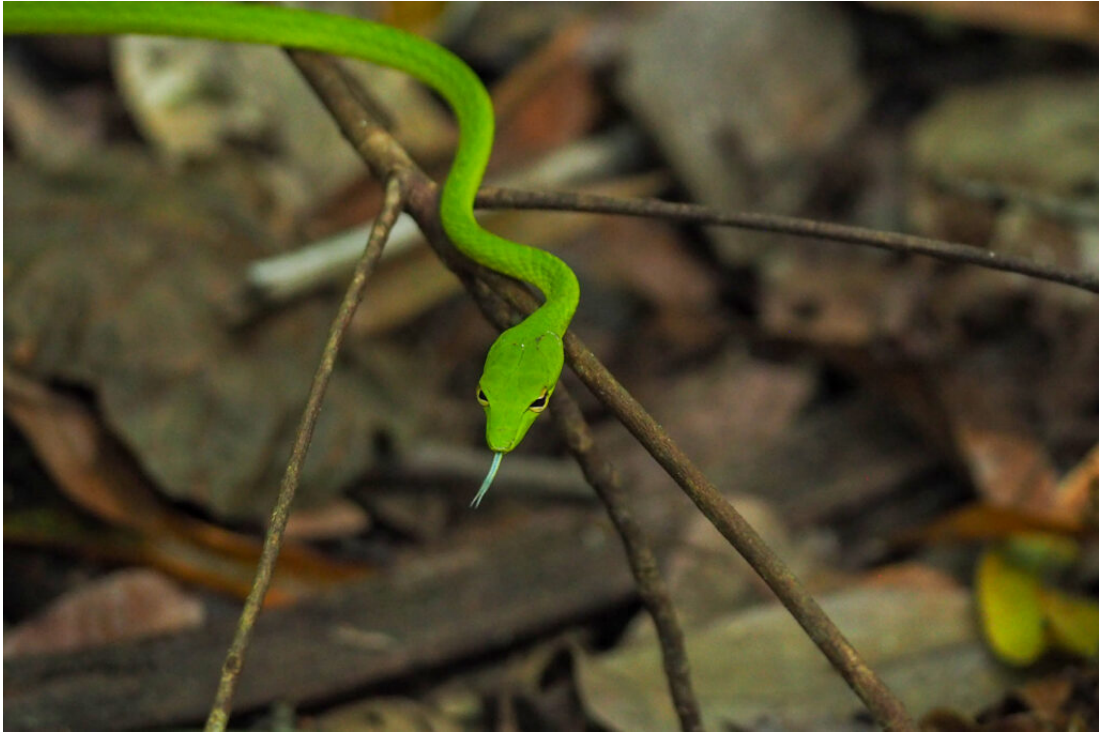
Vine Snake