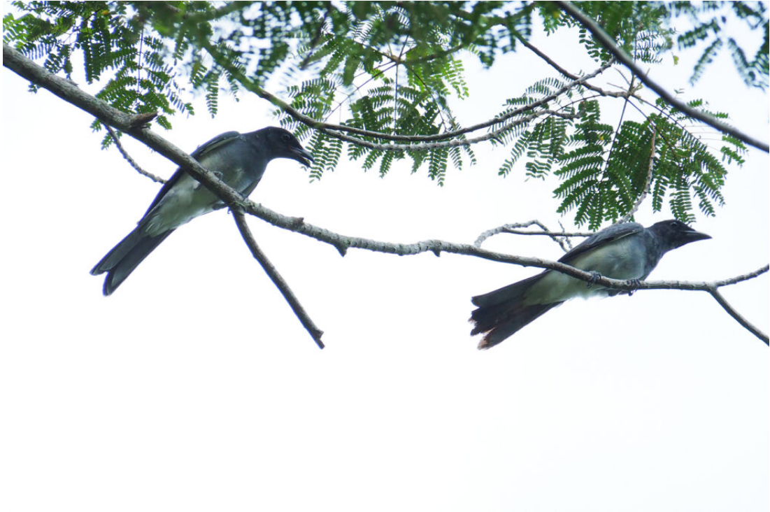
Moluccan Cuckooshrike