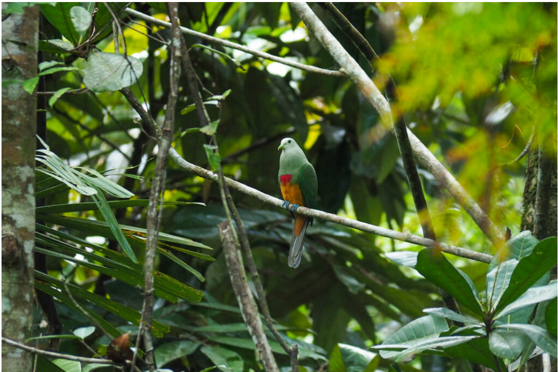
Scarlet-breasted Fruit Dove