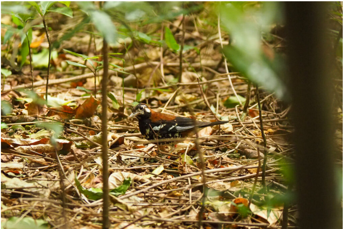
Red-backed Thrush