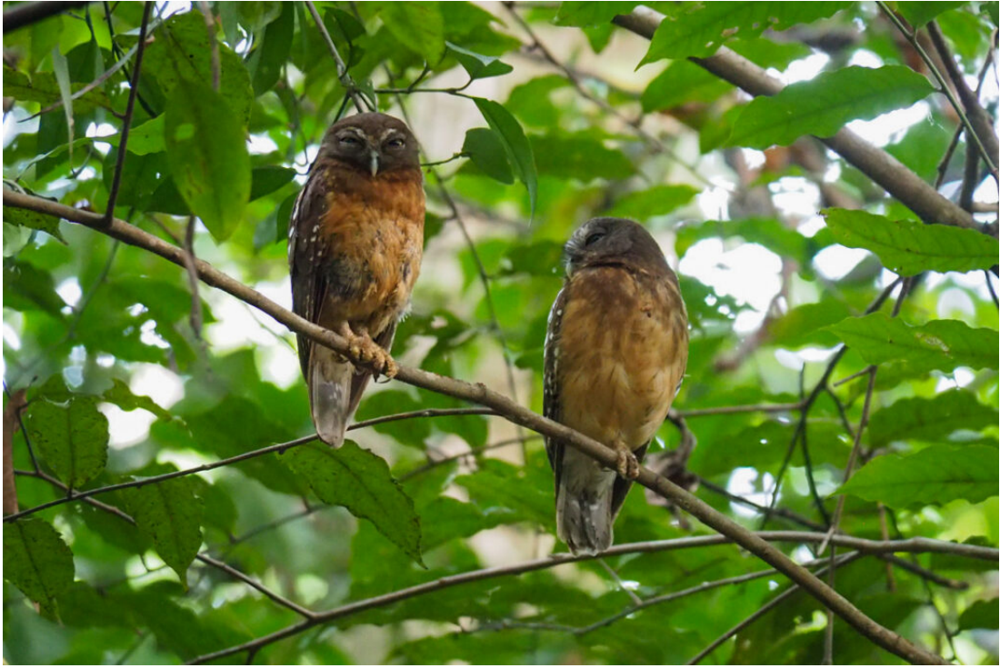
Ochre-bellied Boobook