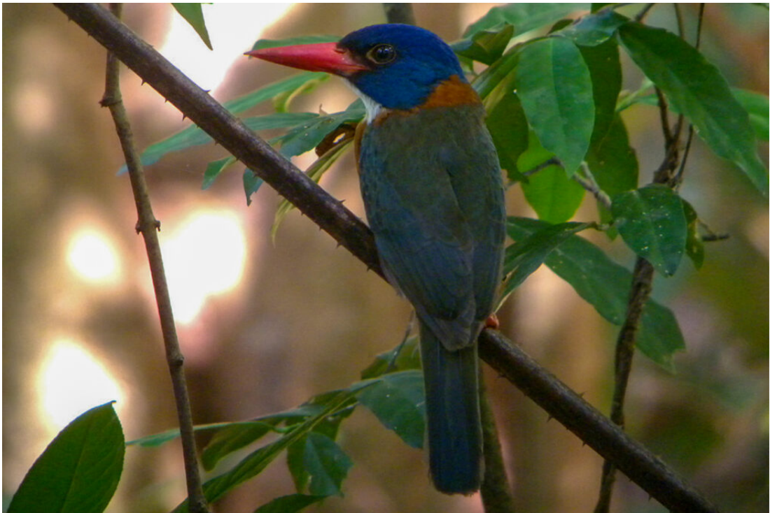
male Green-backed Kingfisher