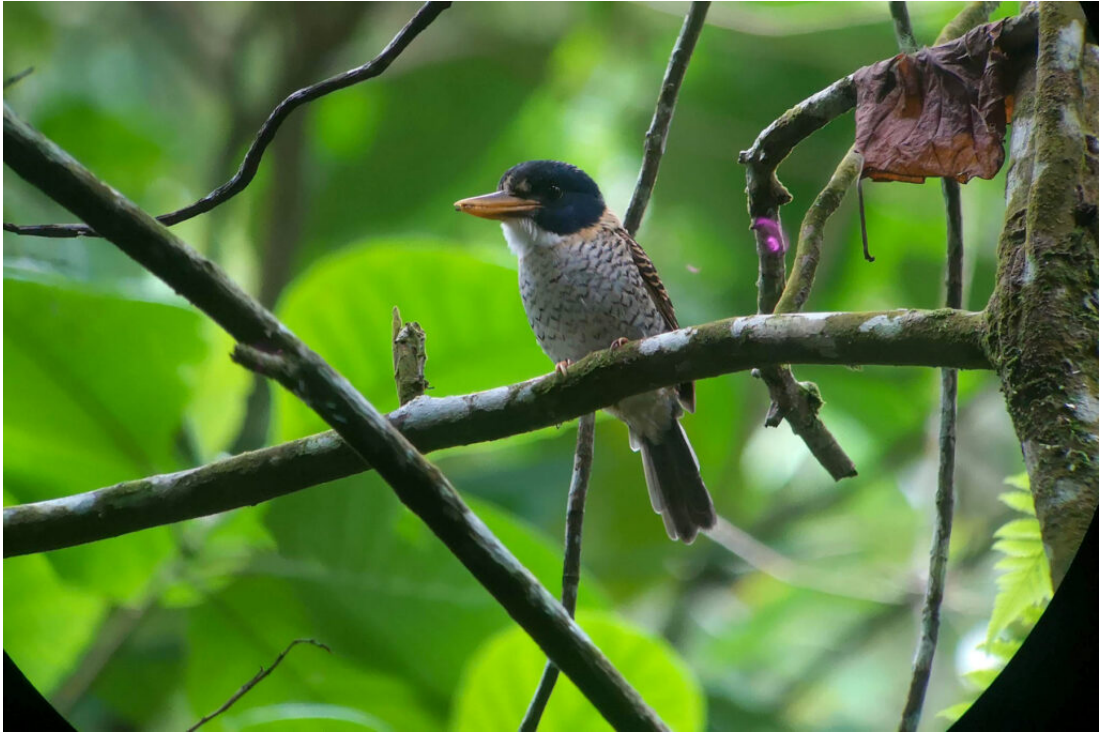
Scaly Kingfisher