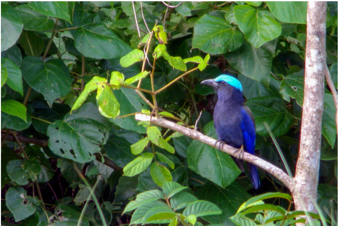
Purple-winged Roller