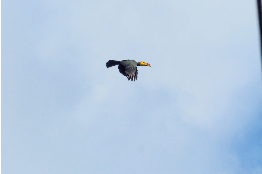
Sulawesi Dwarf Hornbill