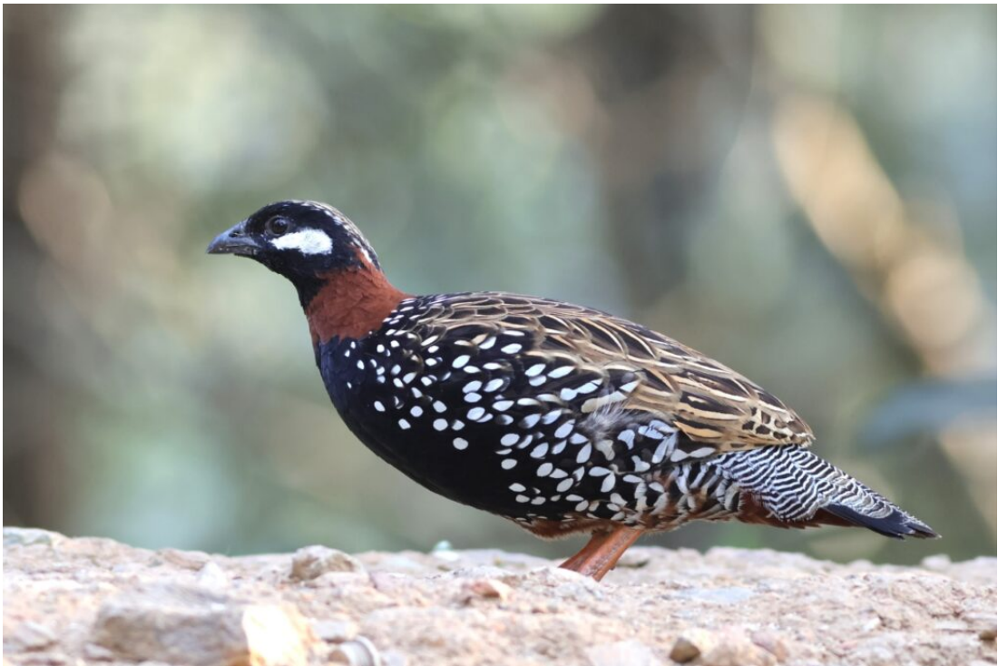
Black Francolin