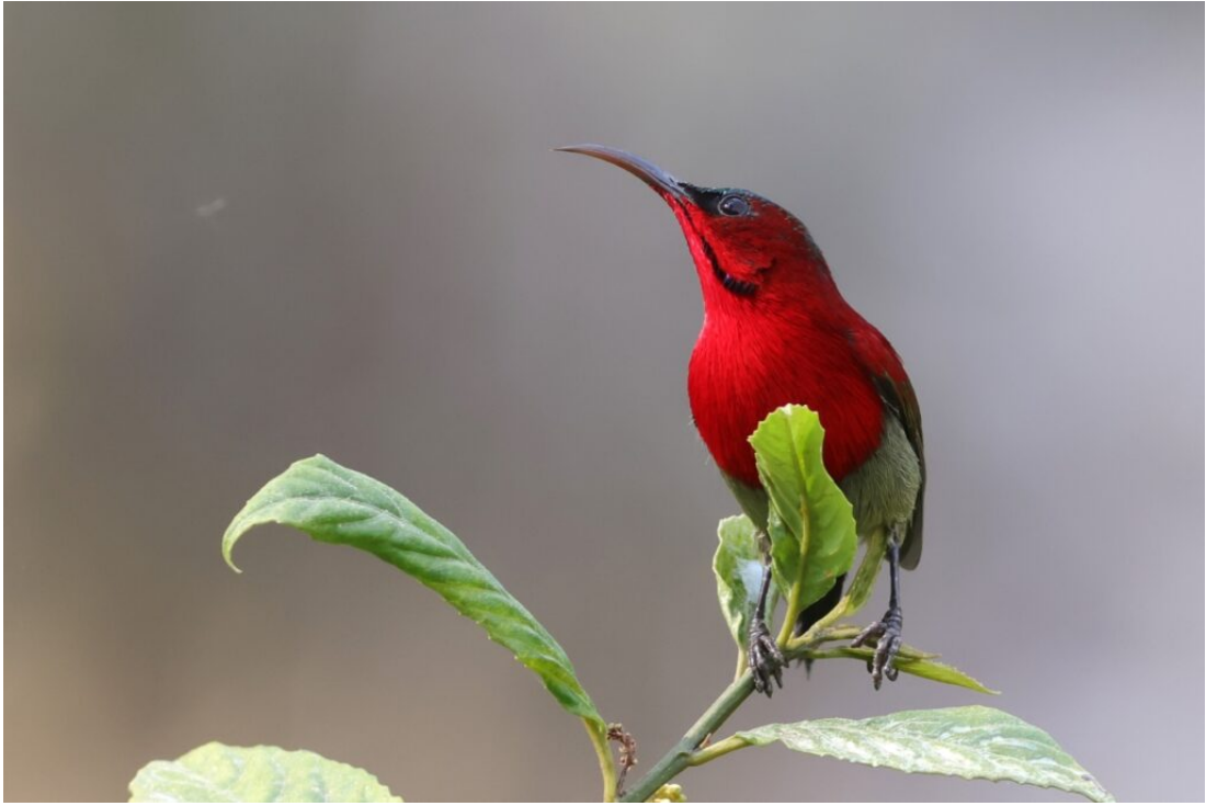
Crimson Sunbird