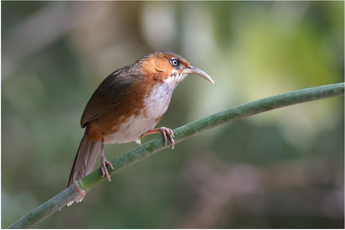
Rusty-cheeked Scimitar Babbler