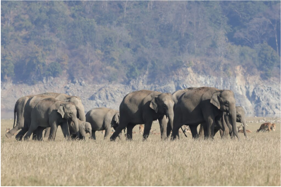
Asian Elephants