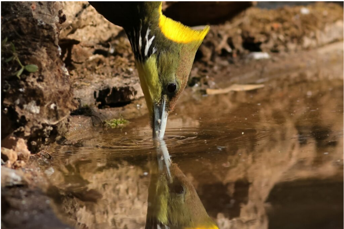
Greater Yellownape