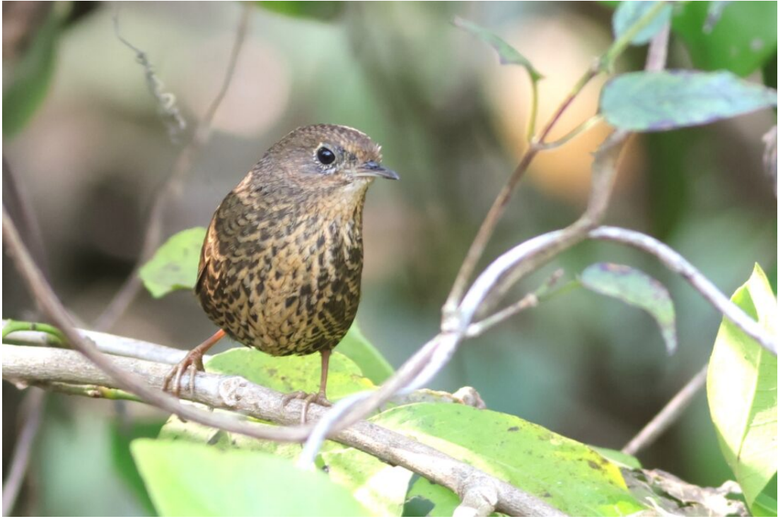
Nepal Cupwing