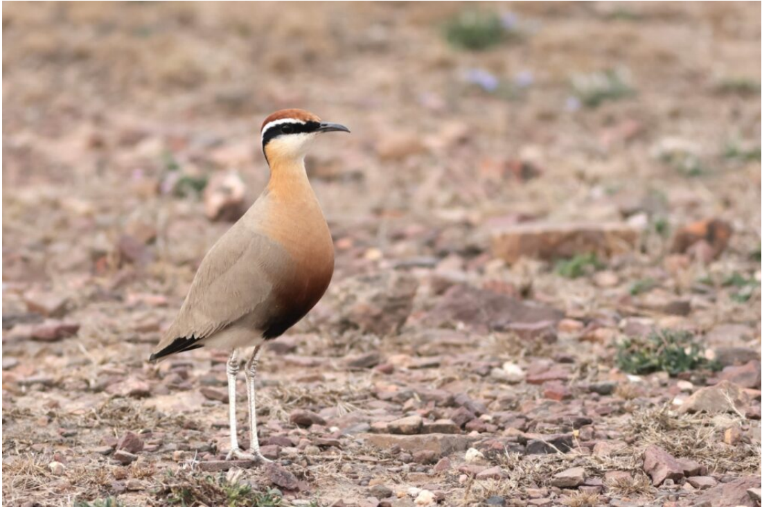
Indian Courser (image by Hannu Jännes)