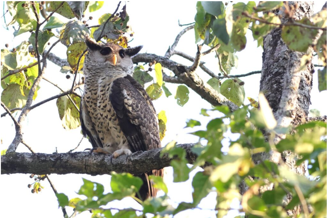
Spot-bellied Eagle-Owl