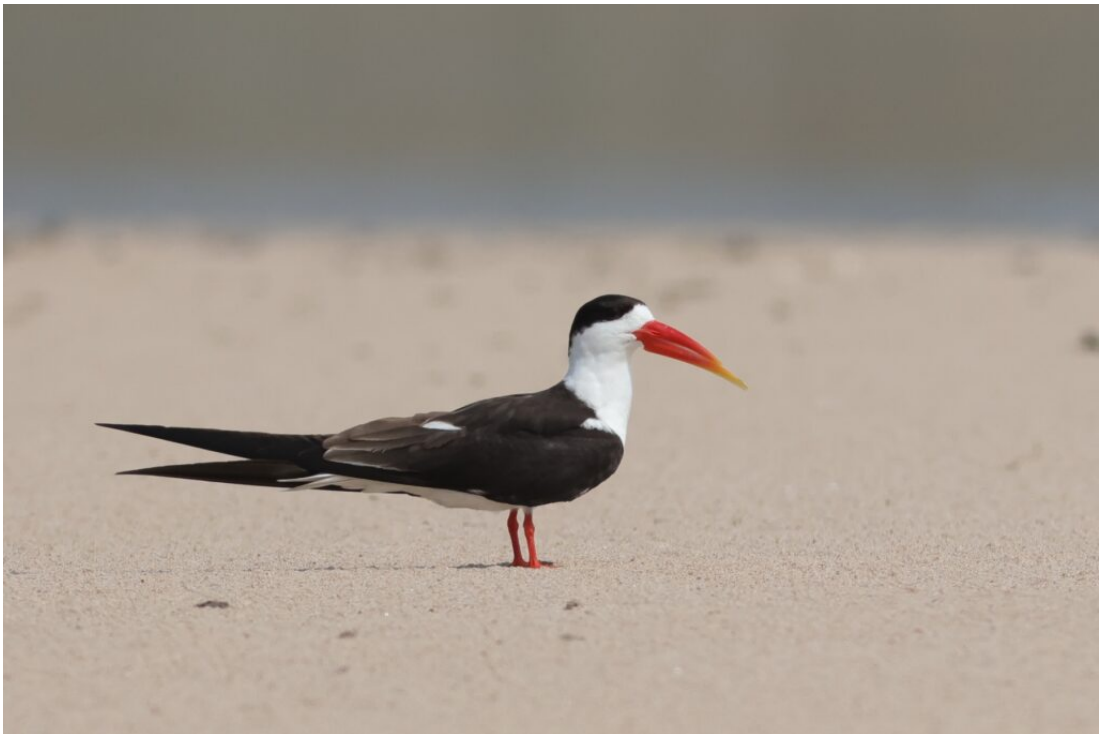
Indian Skimmer