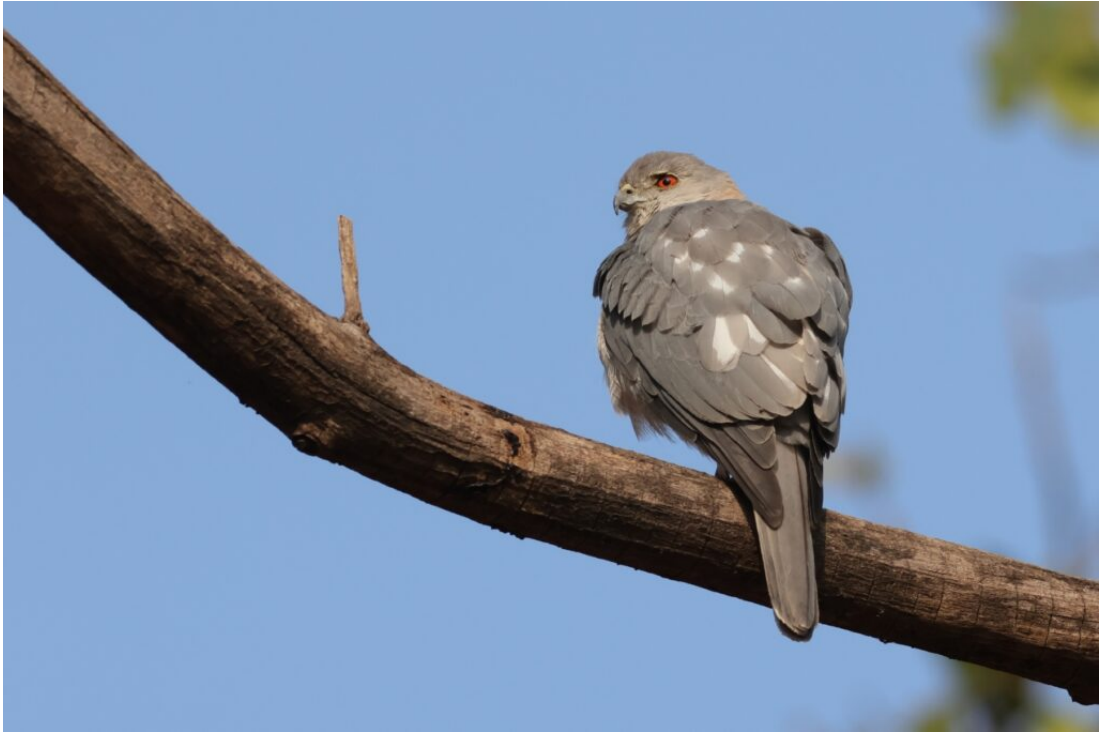
Shirka