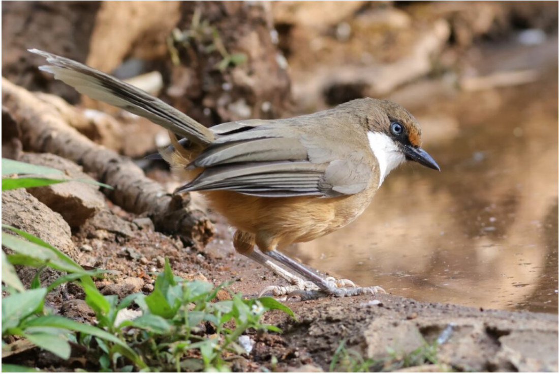
White-throated Laughingthrush