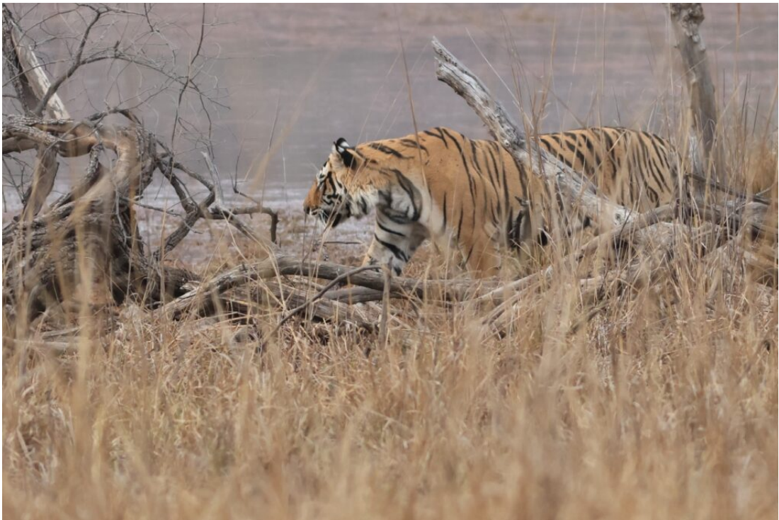
Tiger