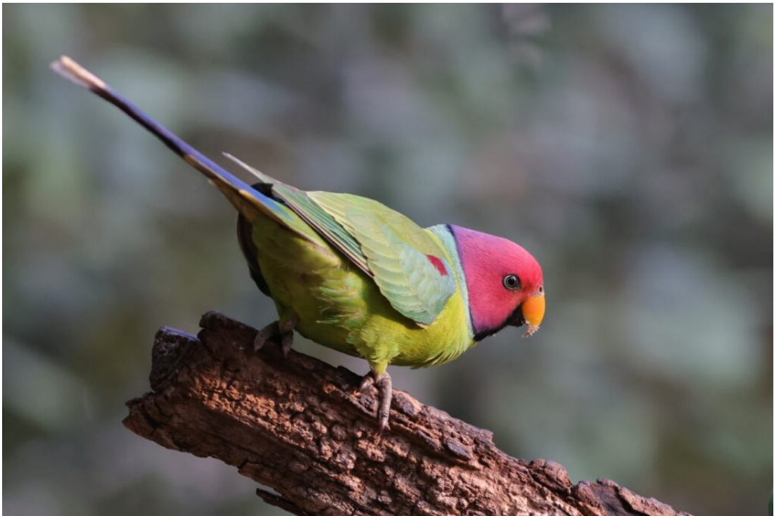
Plum-headed Parakeet