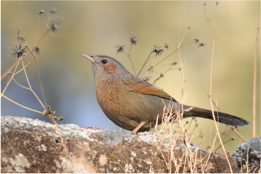
Streaked Laughingthrush