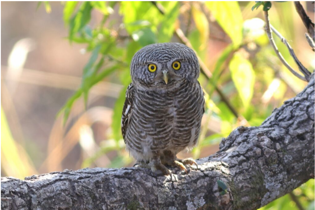
Asian Barred Owlet