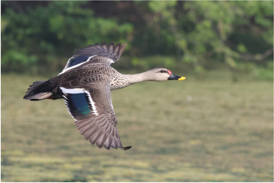
Indian Spot-billed Duck