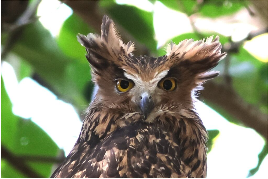
Tawny Fish Owl