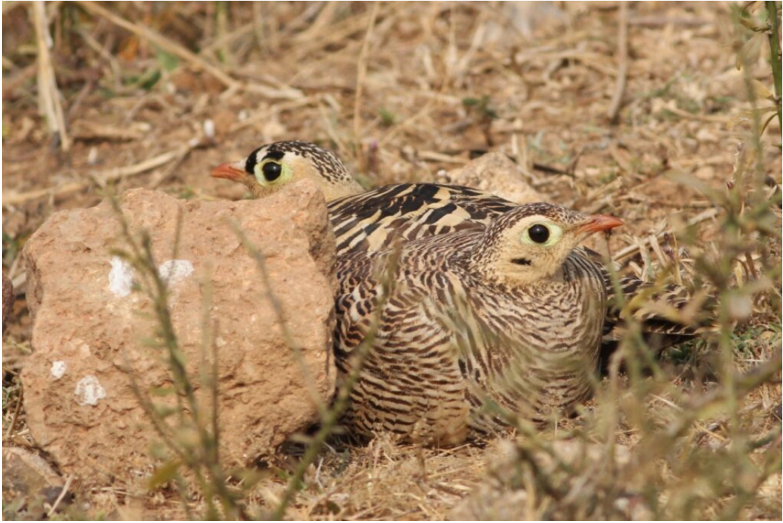
Painted Sandgrouse