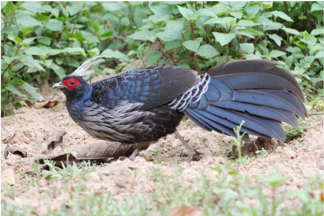
Kalij Pheasant