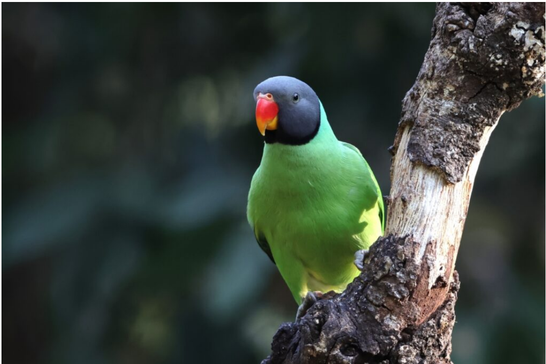
Slaty-headed Parakeet