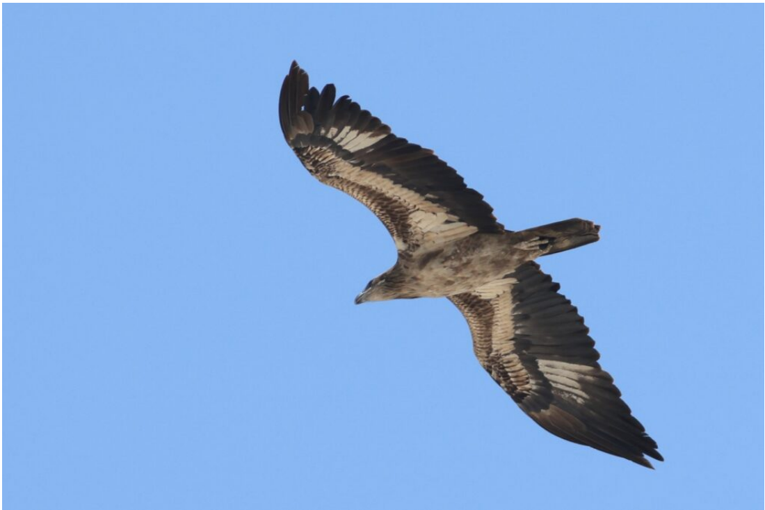
Pallas's Fish Eagle