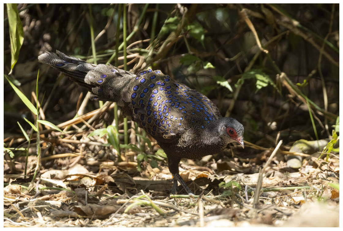
Germain's Peacock-Pheasant