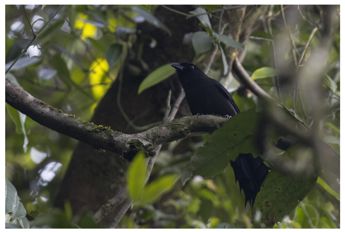
Ratchet-tailed Treepie