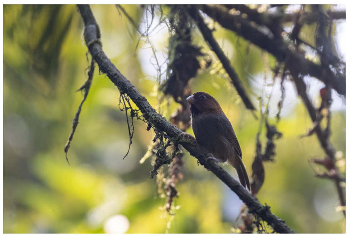
Short-tailed Parrotbill