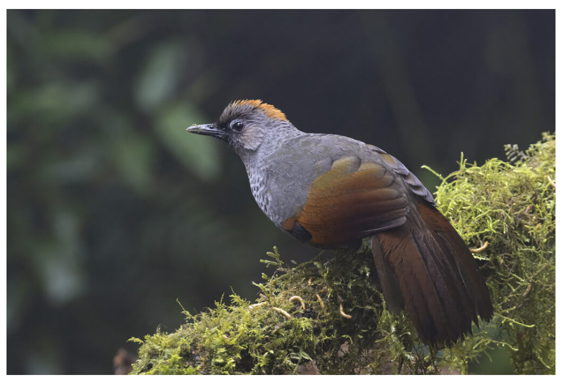
Golden-winged Laughingthrush (image by Dáni Balla)