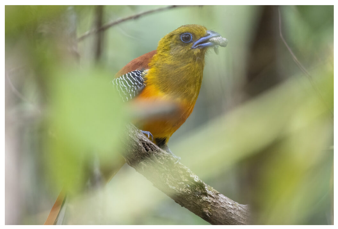
Orange-breasted Trogon