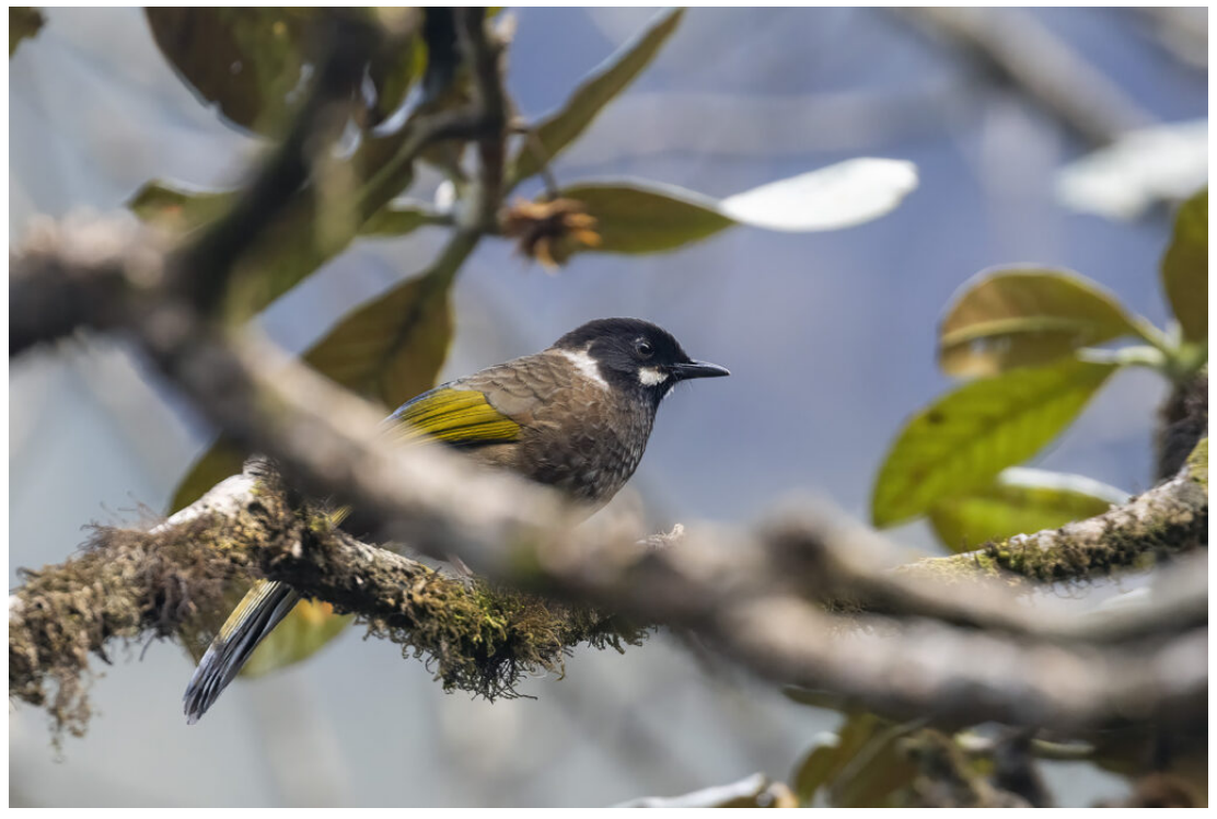
Black-faced Laughingthrush