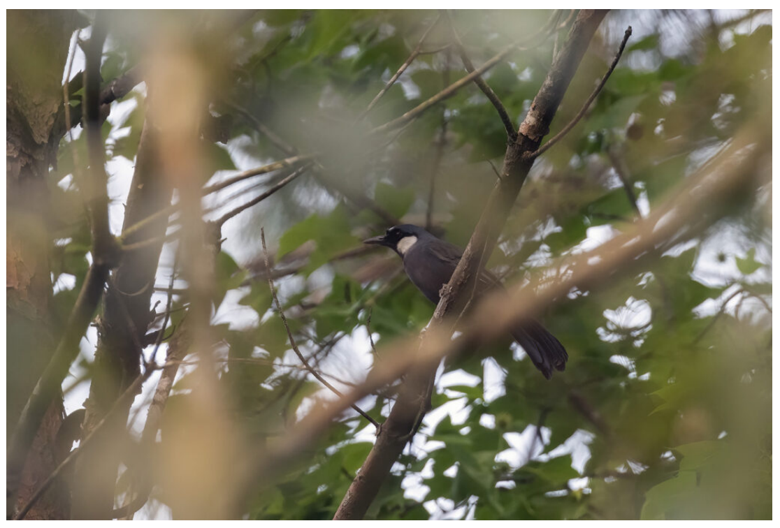
Black-throated Laughingthrush