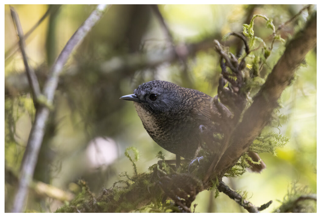
Pale-throated Wren-Babbler