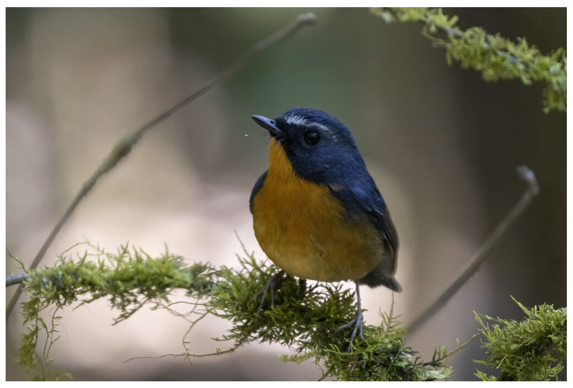
Snowy-browed Flycatcher