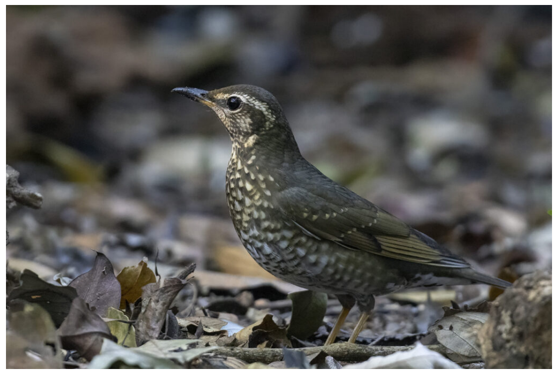
Siberian Thrush