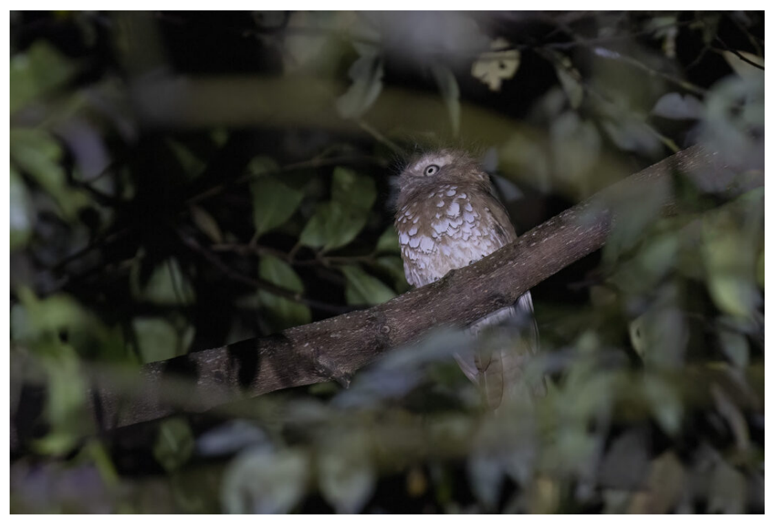
Hodgson's Frogmouth