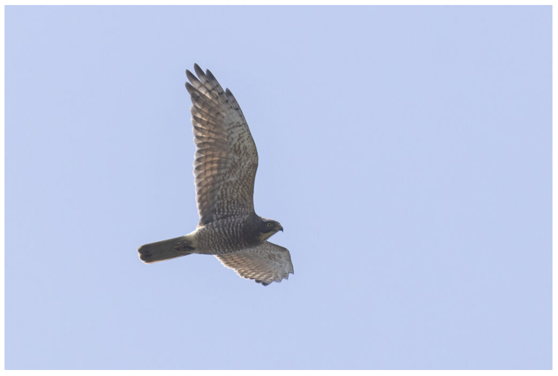
Grey-faced Buzzard