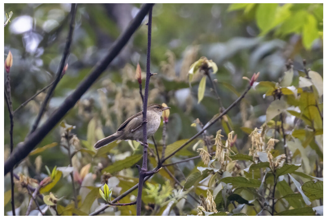
Manchurian Bush Warbler