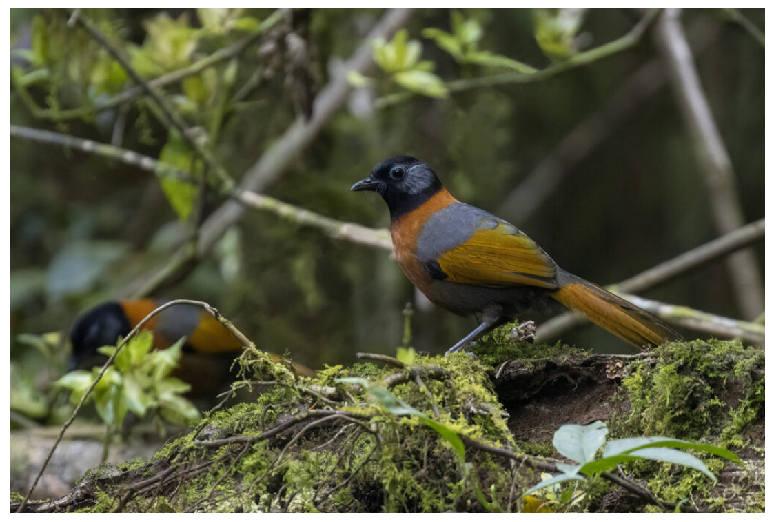
Collared Laughingthrush