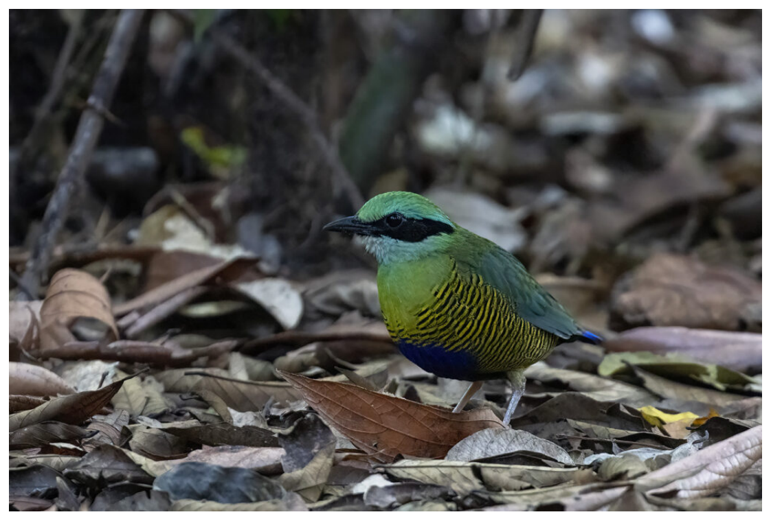
Bar-bellied Pitta