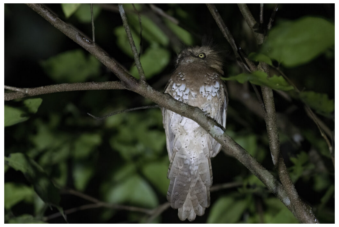
Blyth's Frogmouth