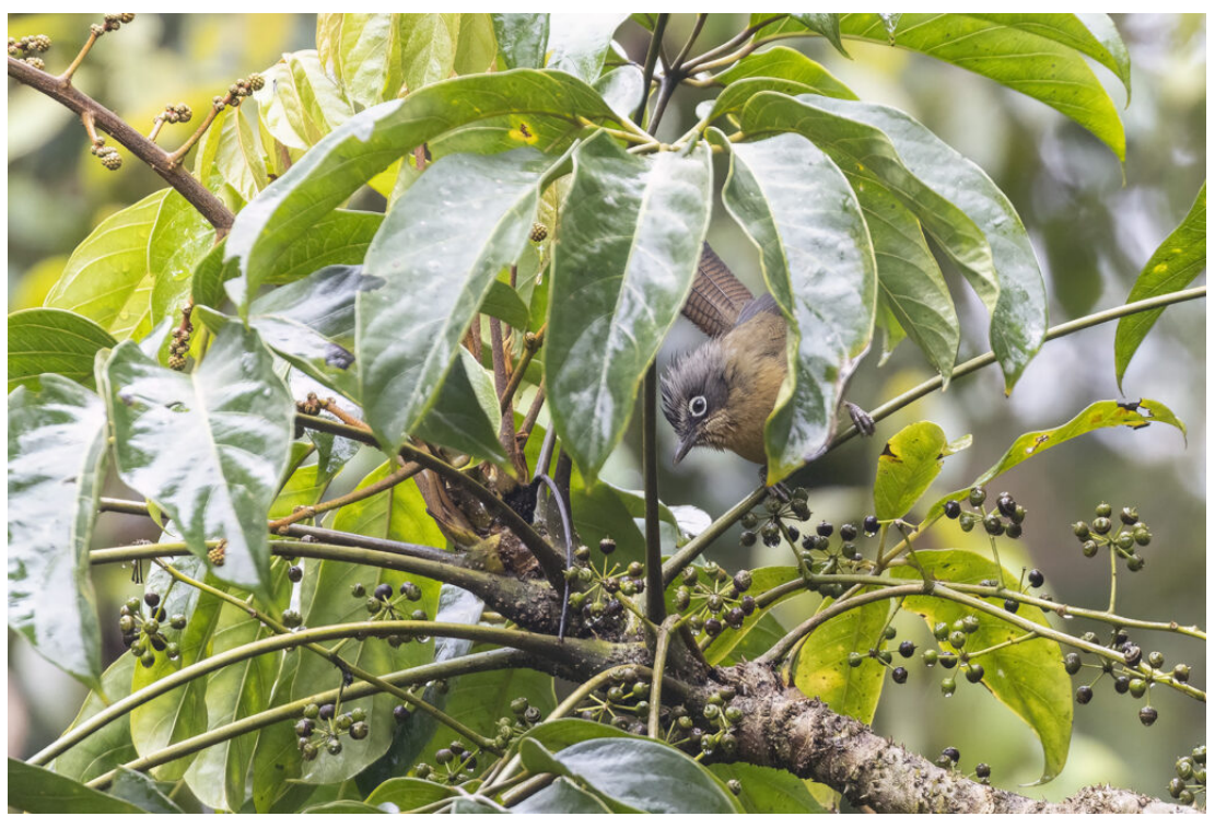
Black-crowned Barwing