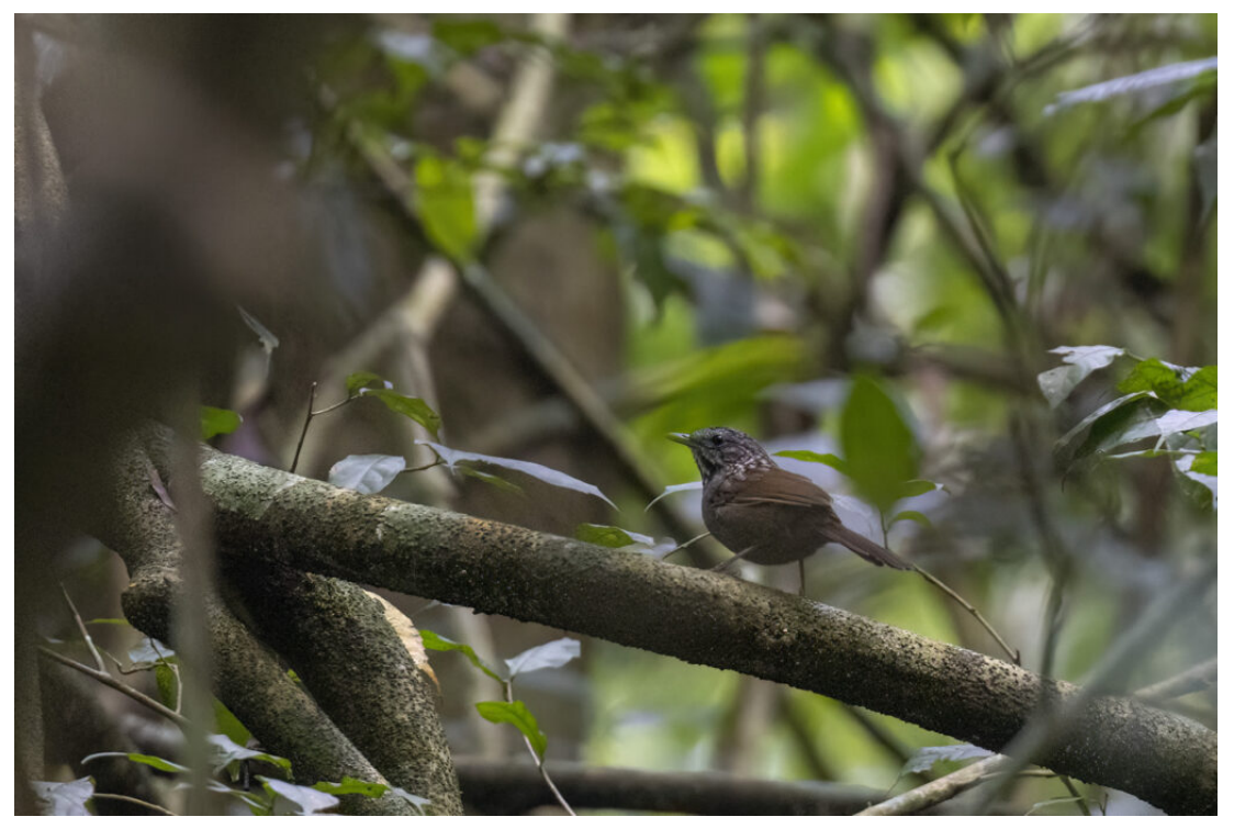
Annam Limestone Babbler