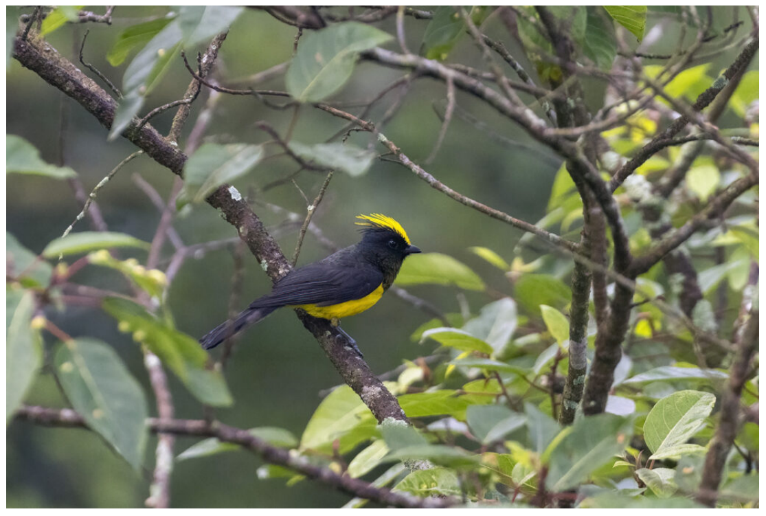
Sultan Tit