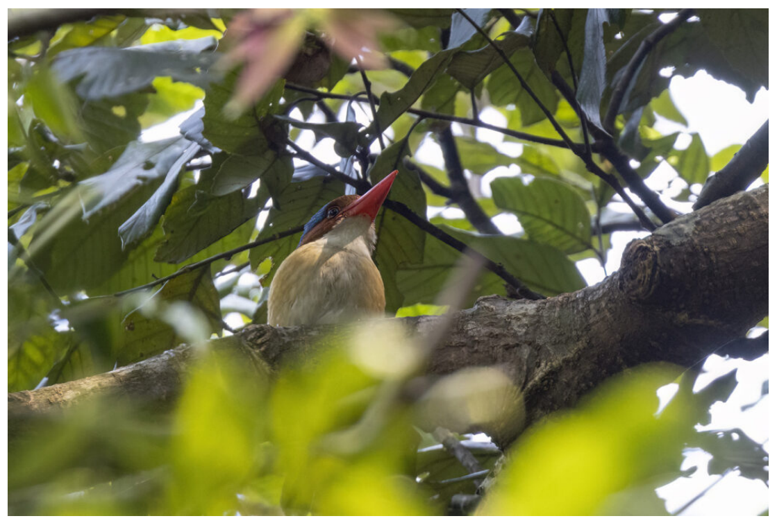
Banded Kingfisher