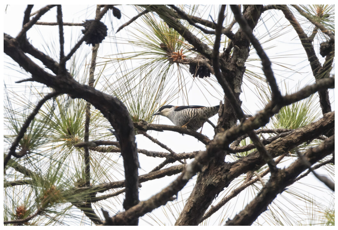
Vietnamese Cutia (image by Dáni Balla)