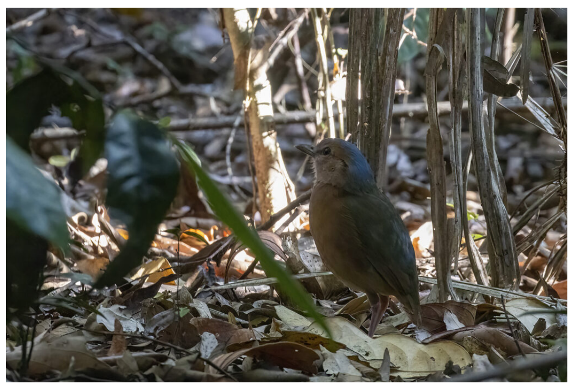
Blue-rumped Pitta