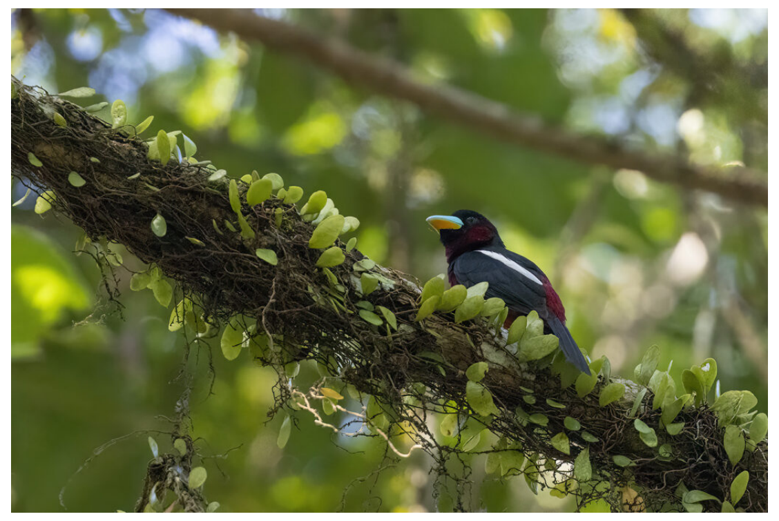
Black-and-red Broadbill