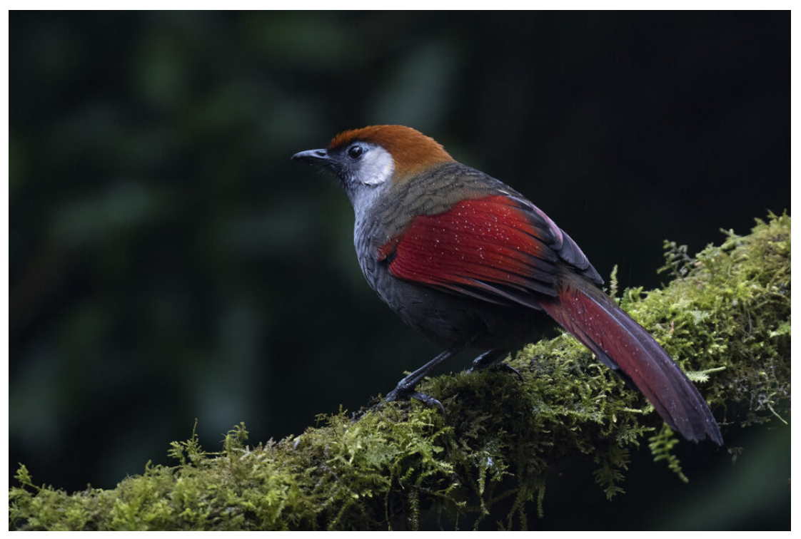
Red-tailed Laughingthrush