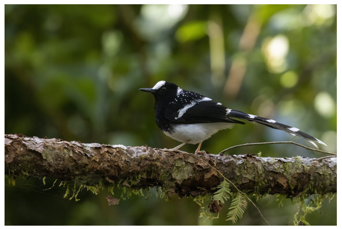
Spotted Forktail