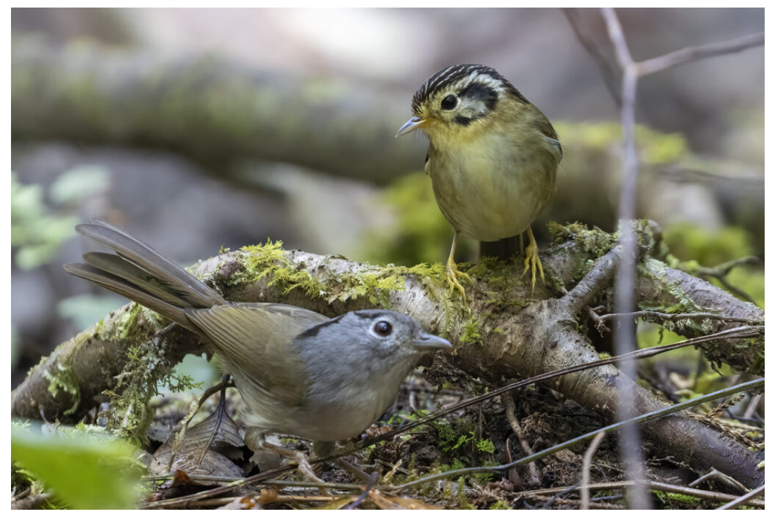
Black-crowned Fulvetta and Mountain Fulvetta