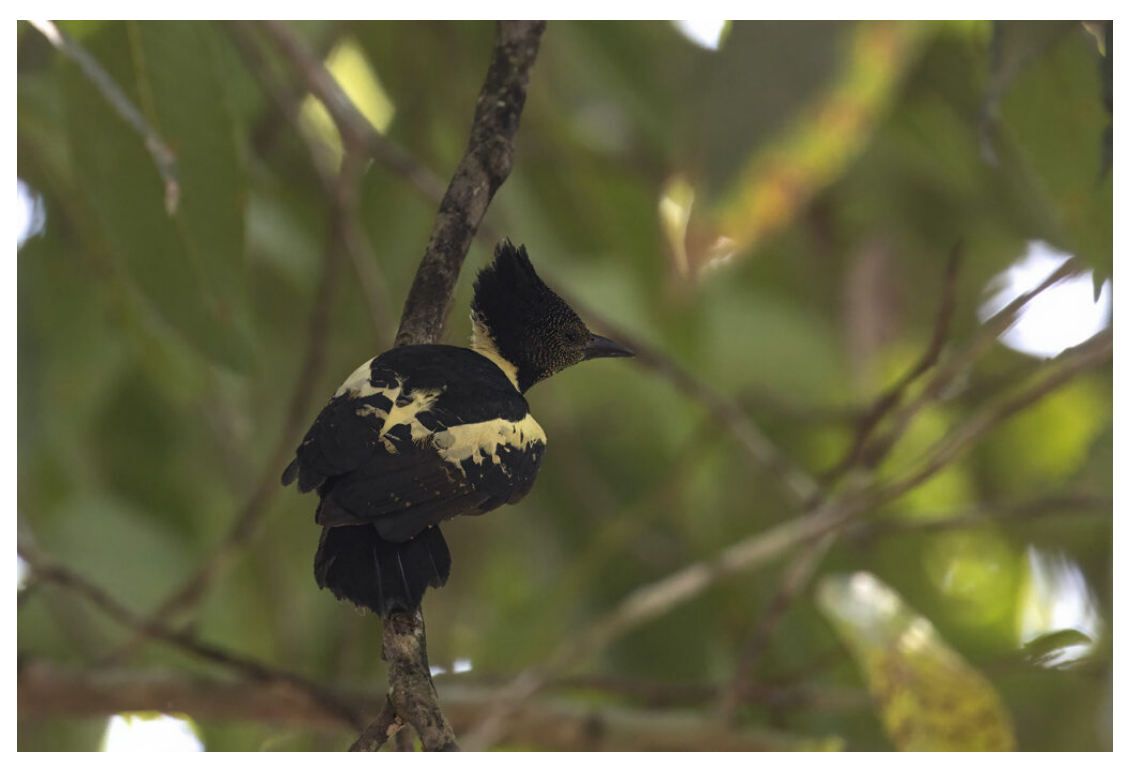
Black-and-buff Woodpecker