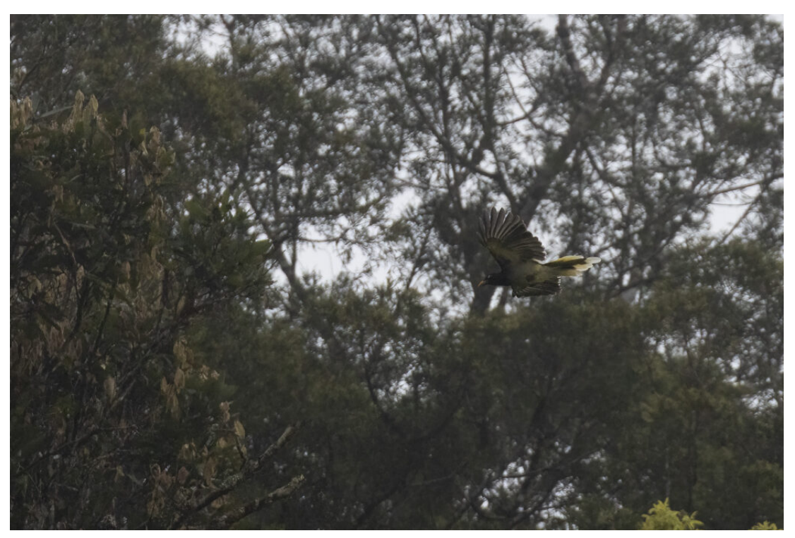
White-winged Magpie