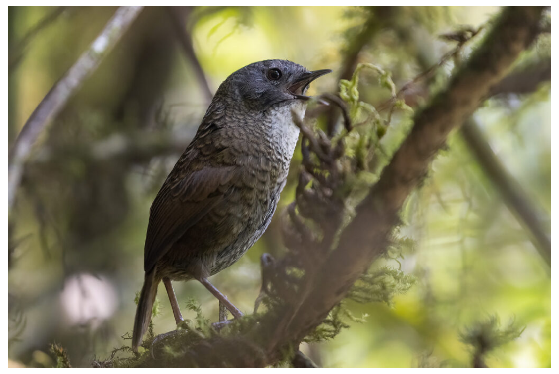
Pale-throated Wren-Babbler