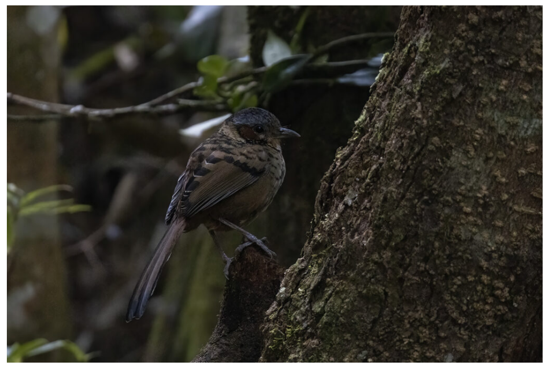
Chestnut-eared Laughingthrush