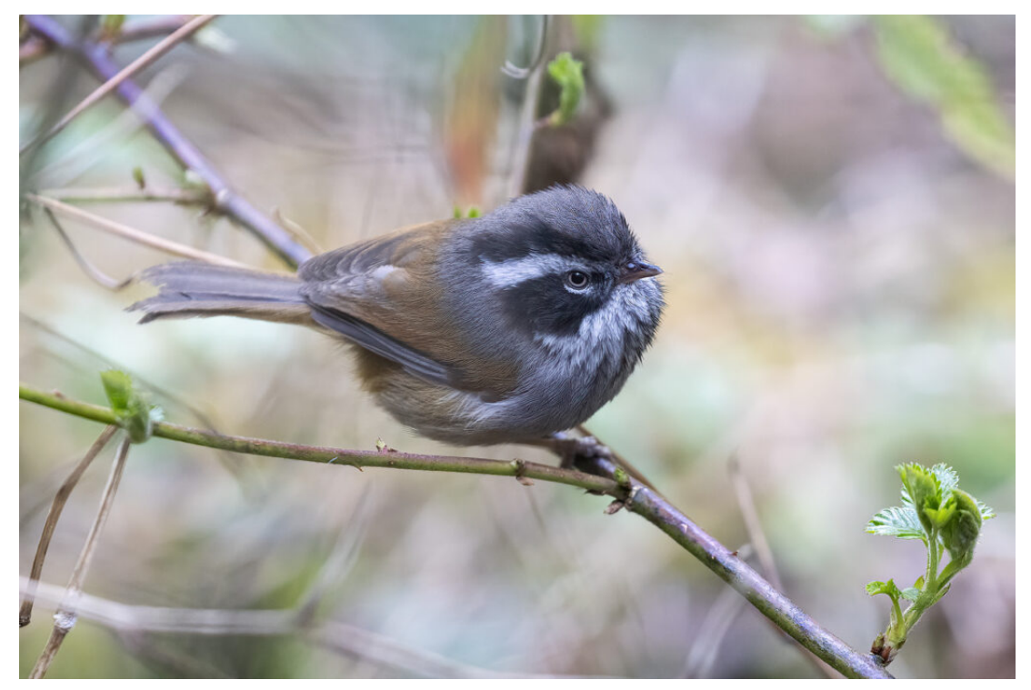
White-browed Fulvetta