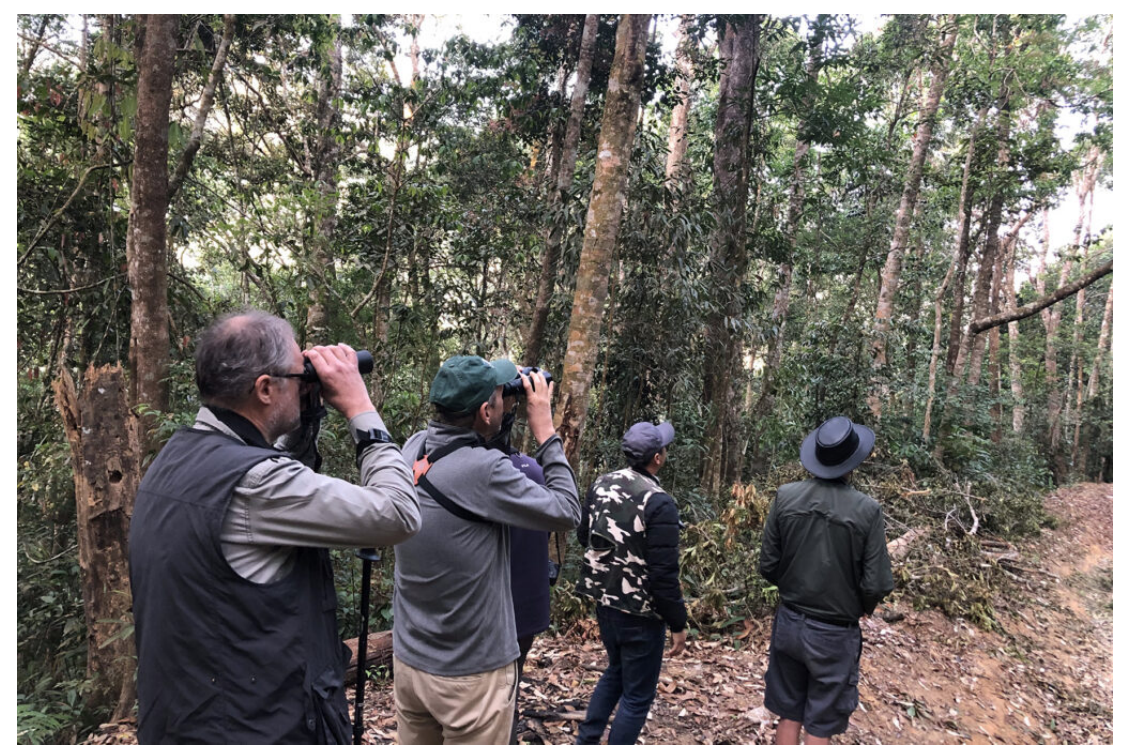
Birding in Vietnam