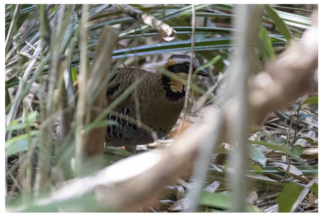
Orange-necked Partridge