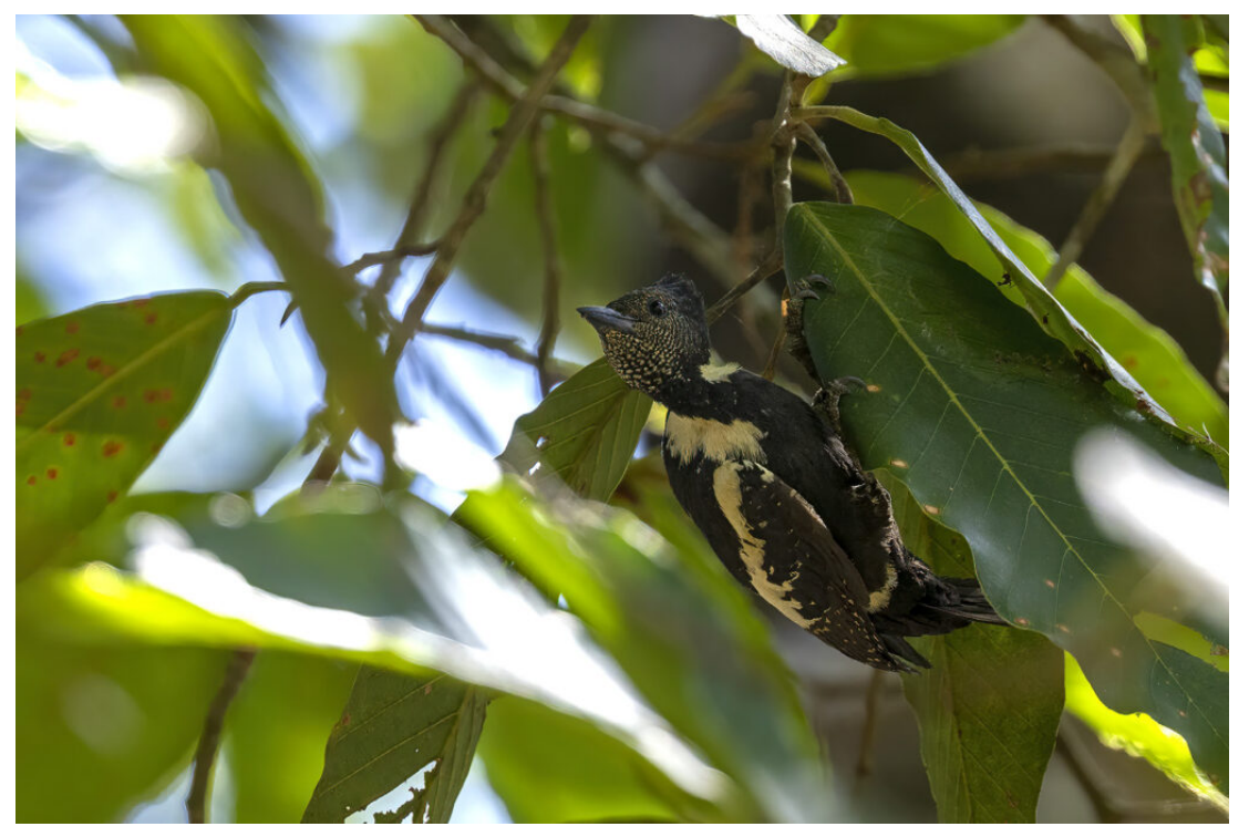
Black-and-buff Woodpecker (image by Dáni Balla)