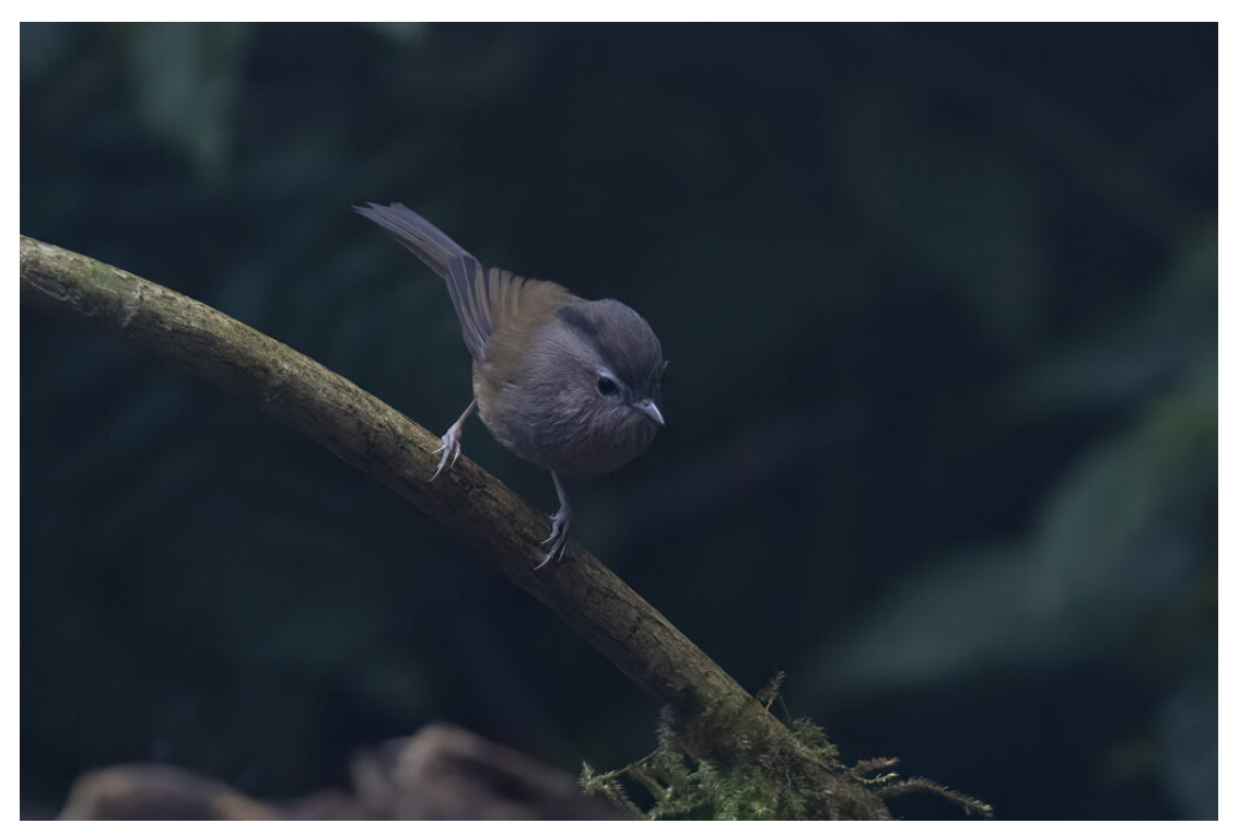
Indochinese Fulvetta