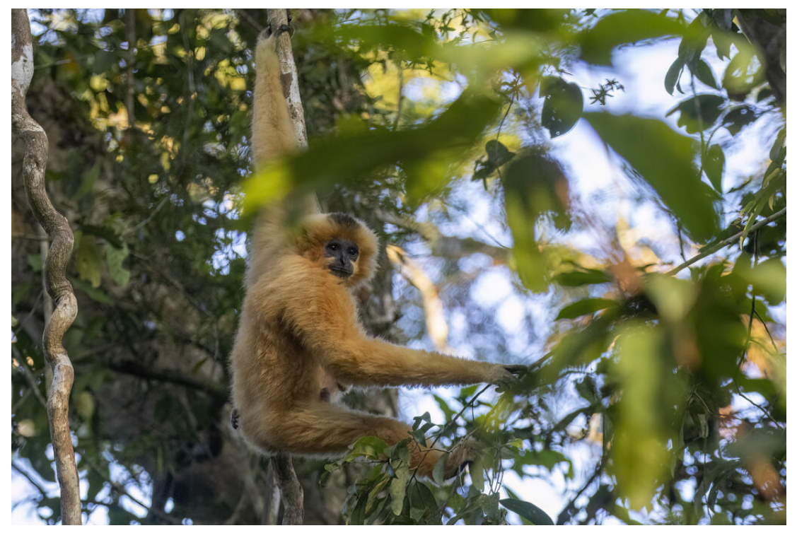
Yellow-cheeked Gibbon