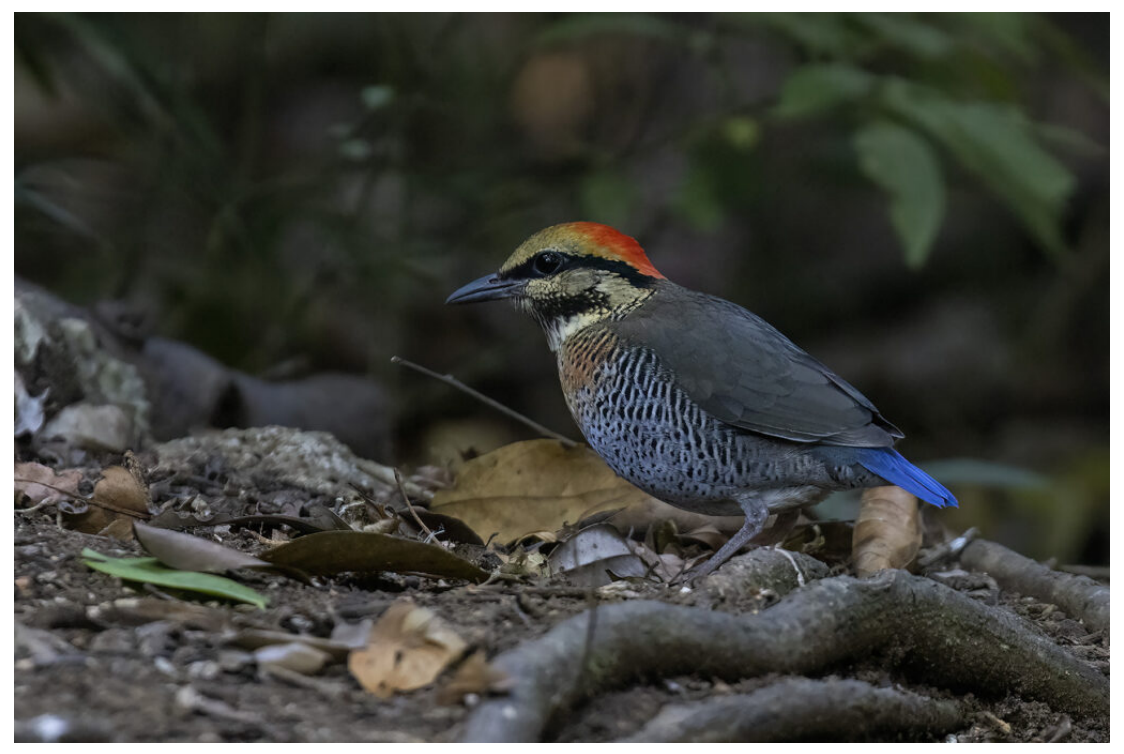
Blue Pitta