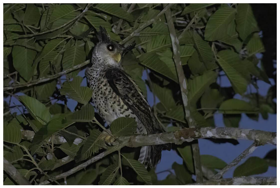
Spot-bellied Eagle-Owl