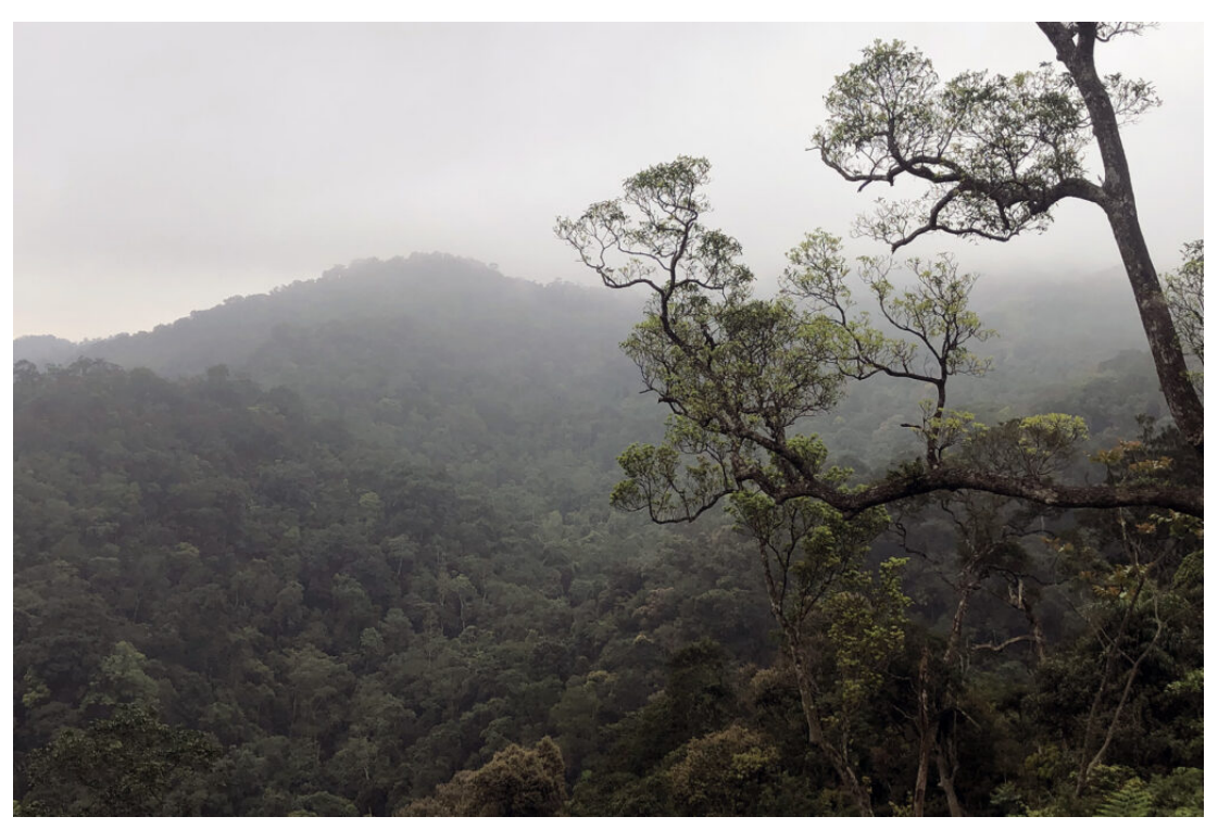
Central Vietnam forest