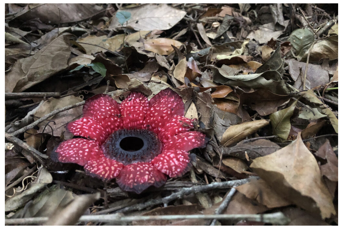
Rafflesia (image by Dáni Balla)