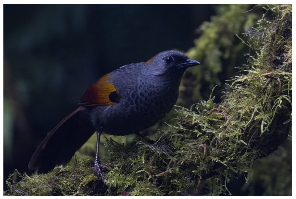
Golden-winged Laughingthrush