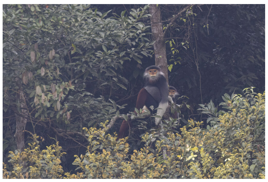
Red-shanked Douc Langur