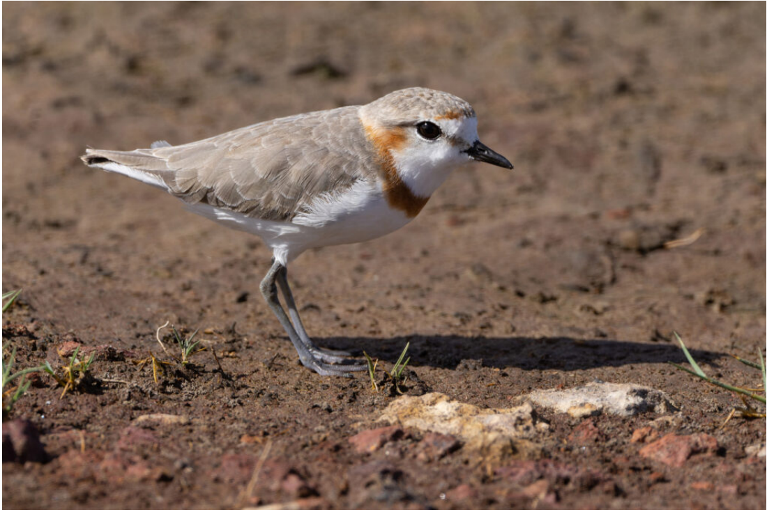
Chestnut-banded Plover