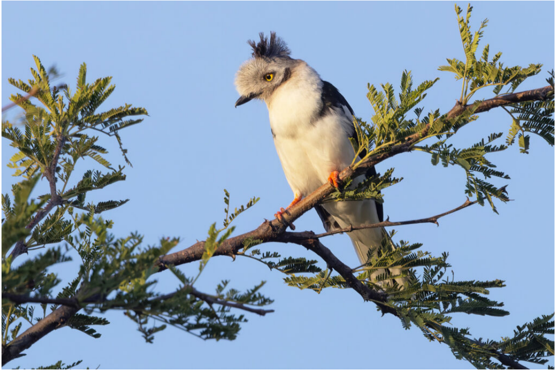
Grey-crested Helmetshrike