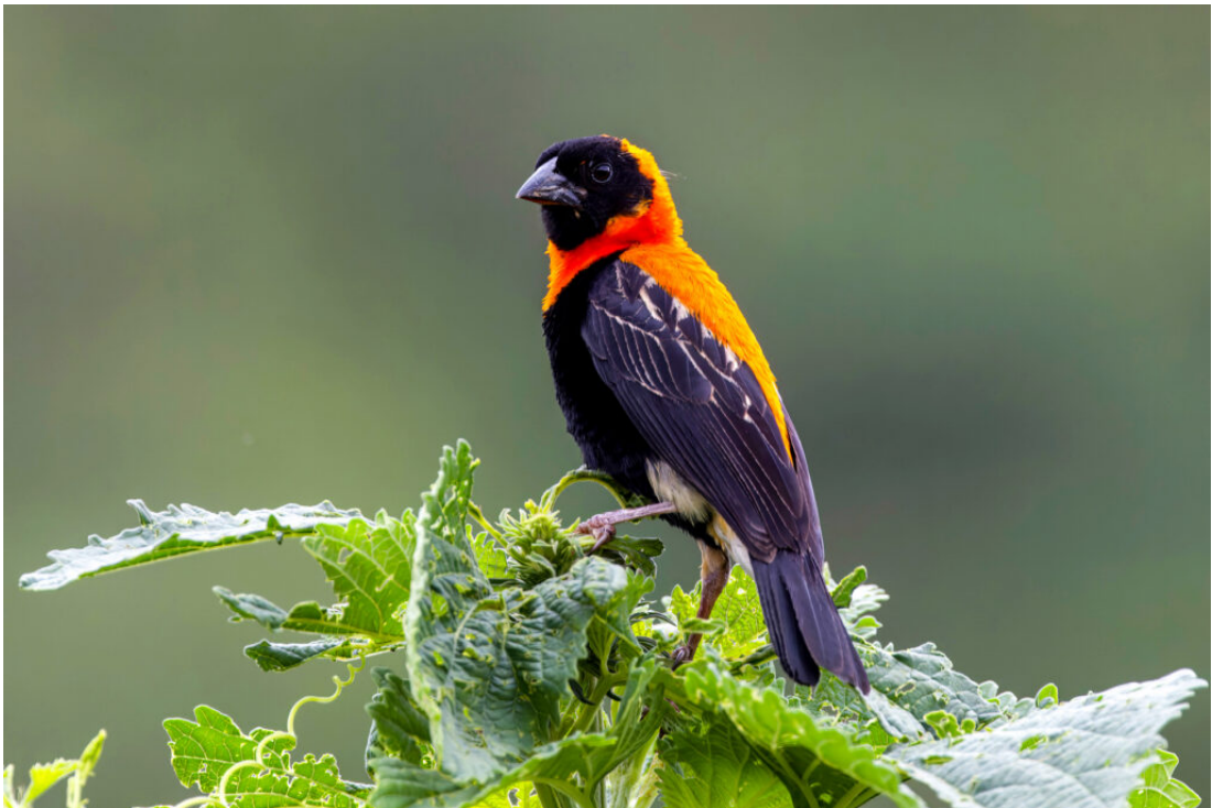
Black Bishop