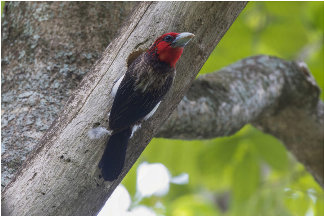
Brown-breasted Barbet