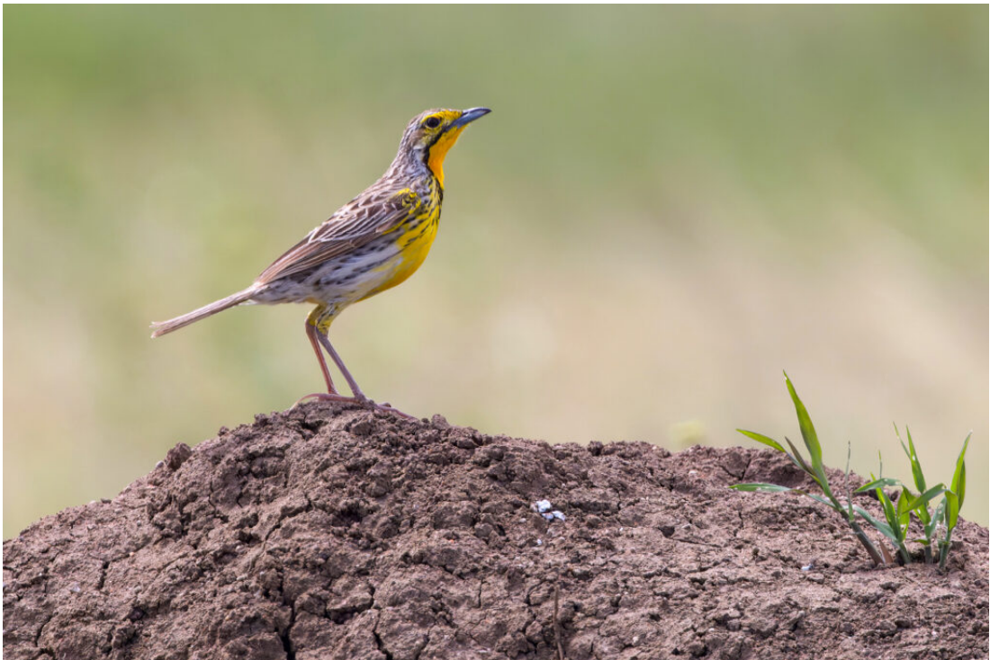
Pangani Longclaw