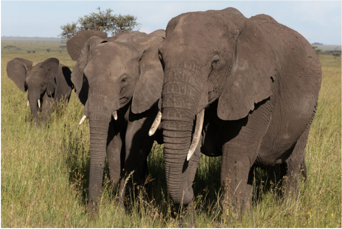
African Savannah Elephant