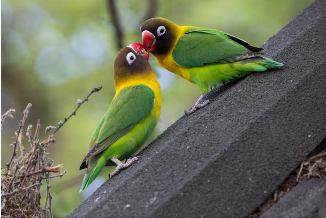
Yellow-collared Lovebird