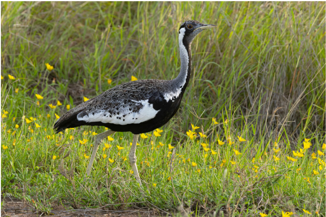
Hartlaub's Bustard