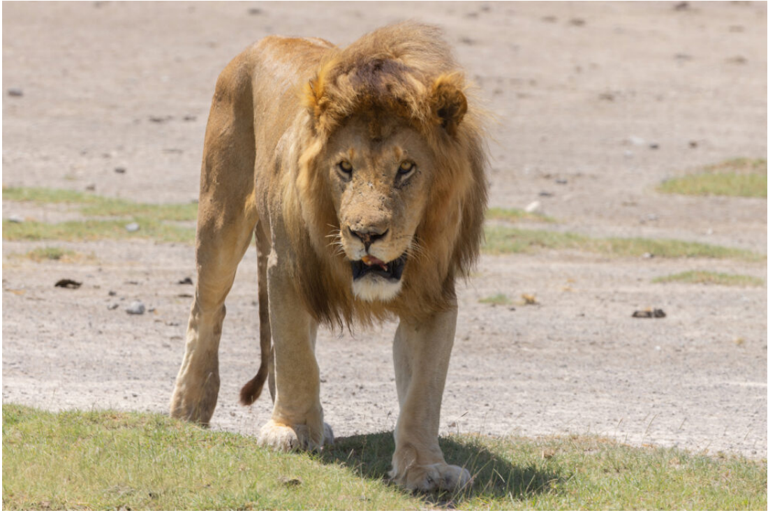
Lion