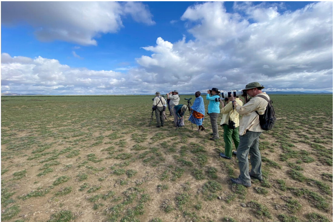
Watching Beesley's Lark