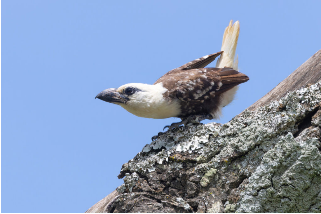
White-headed Barbet