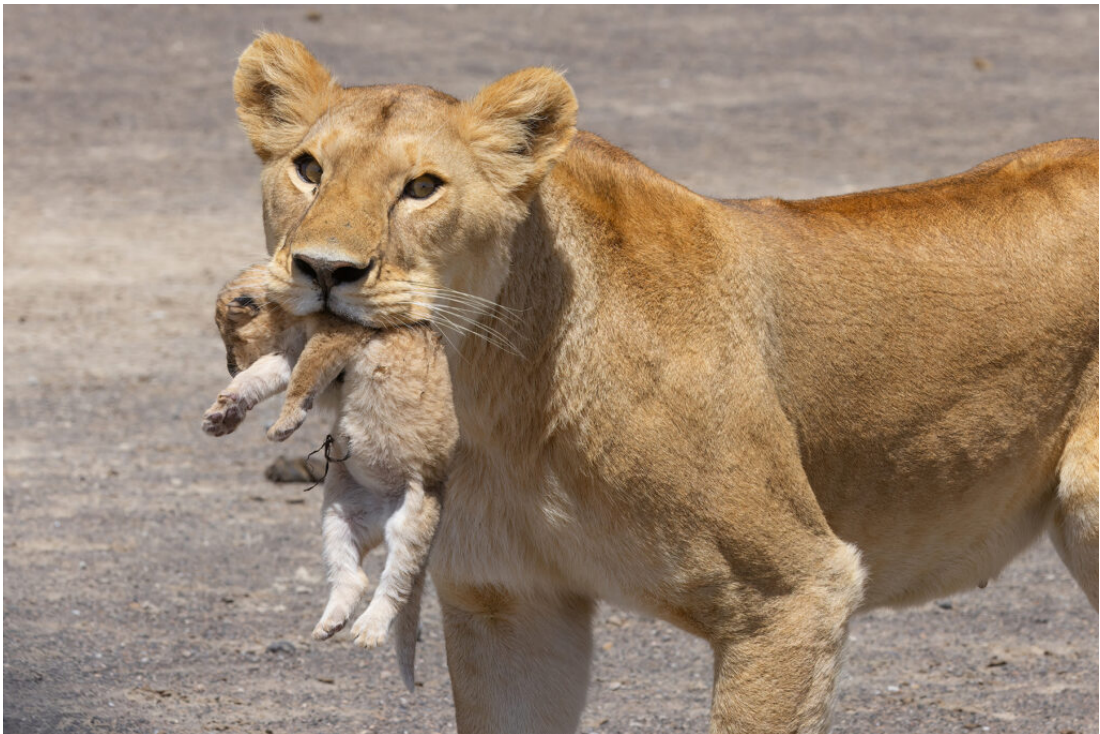
Lioness and cub