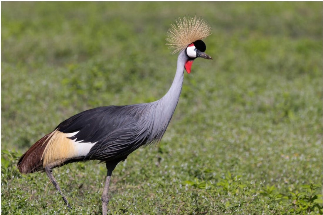
Grey-crowned Crane