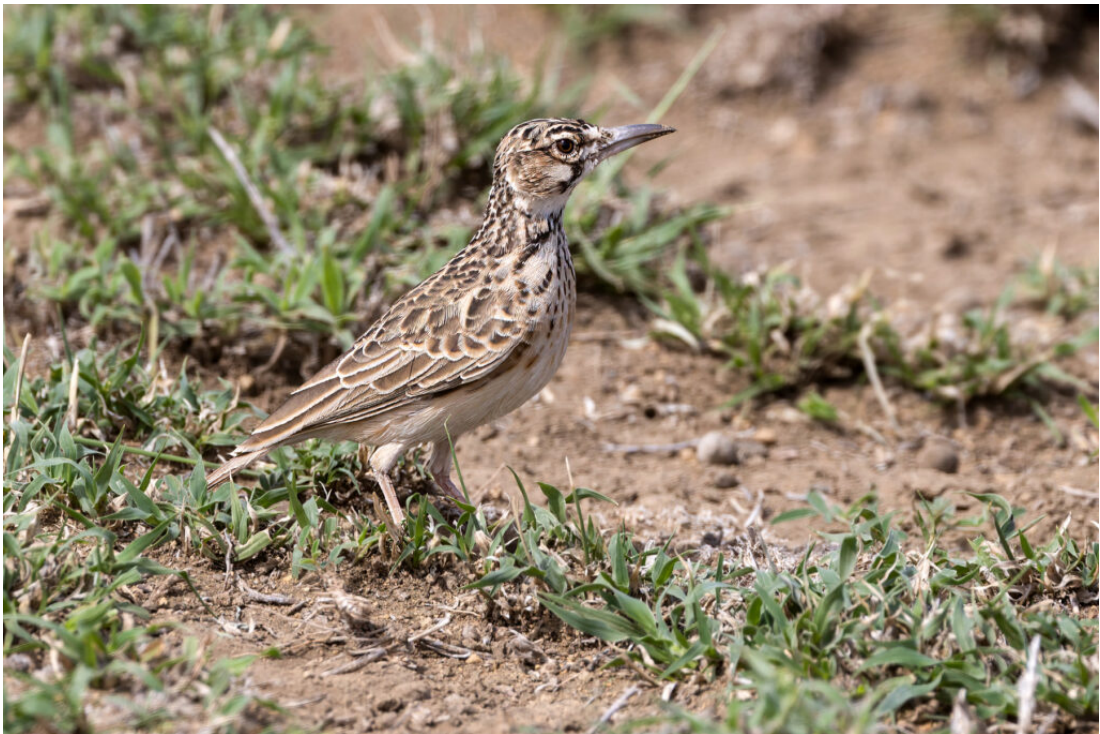
Short-tailed Lark