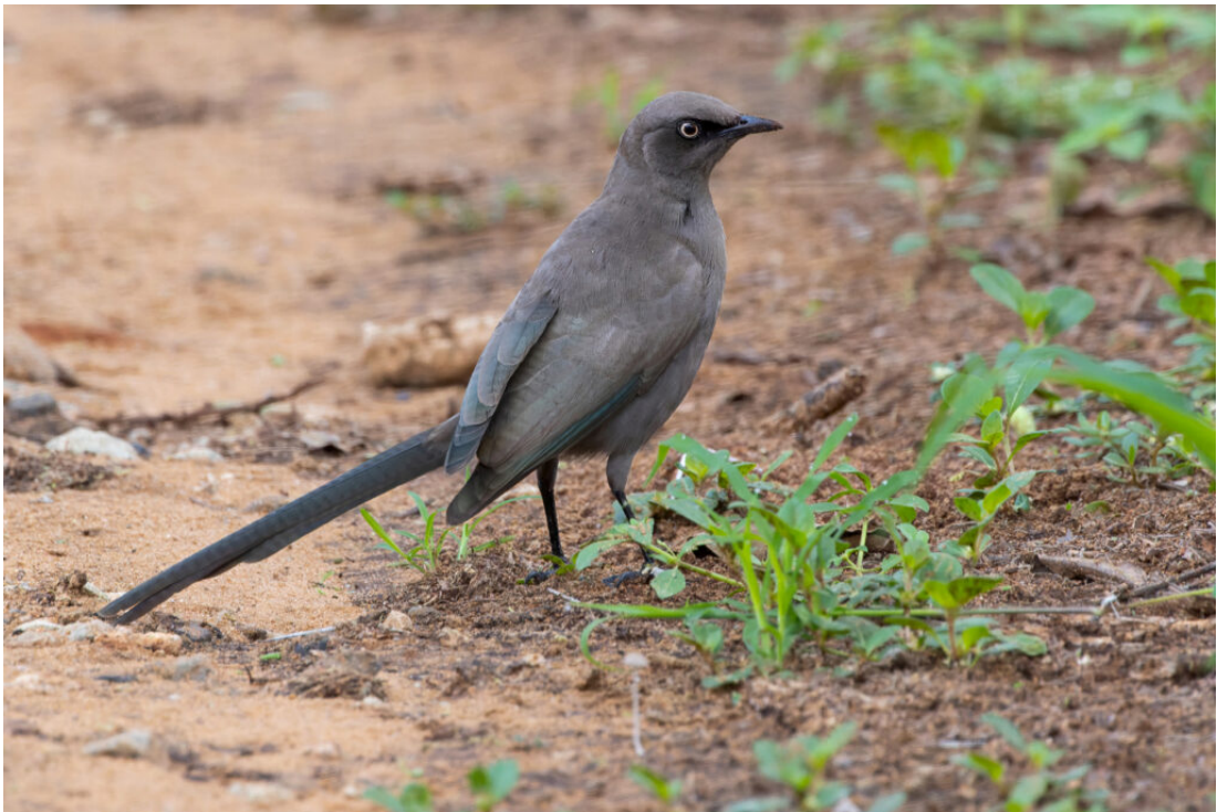
Ashy Starling