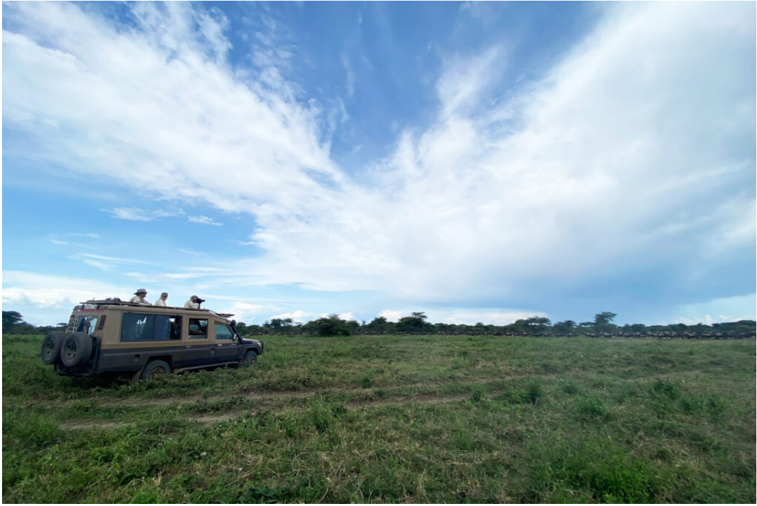
Watching the migration