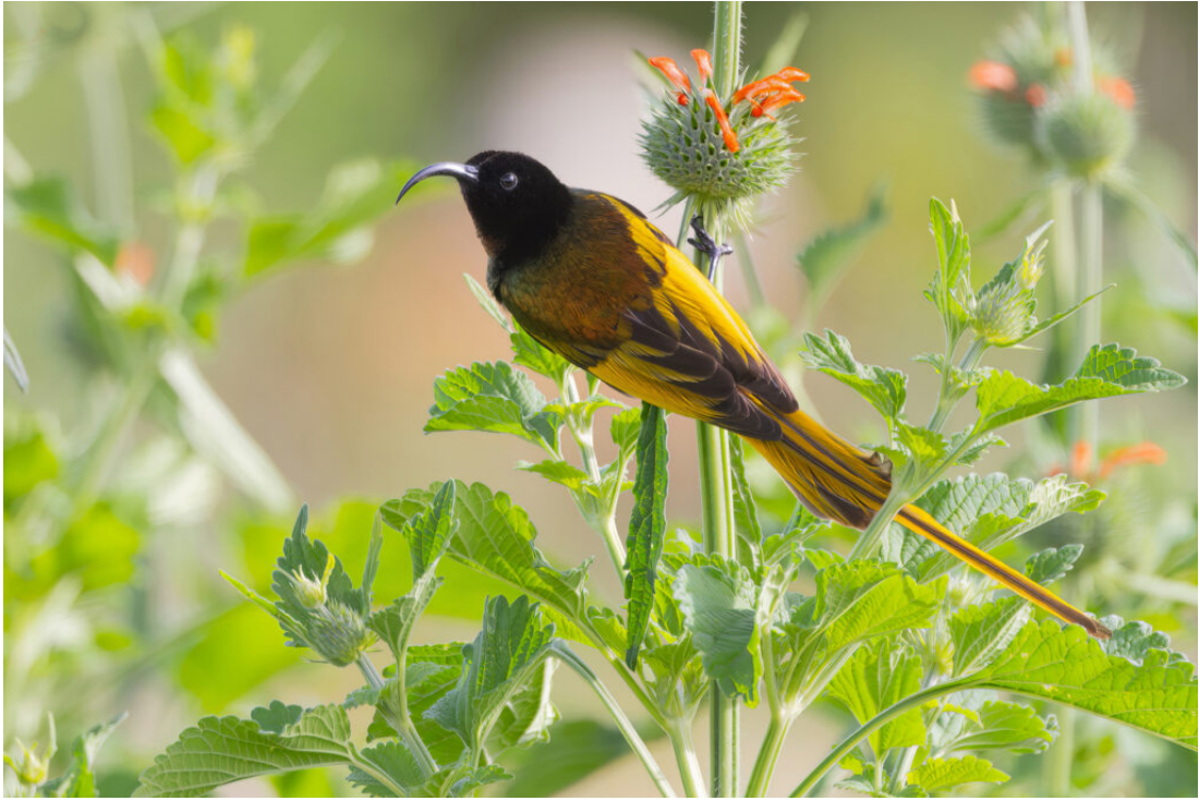
Golden-winged Sunbird