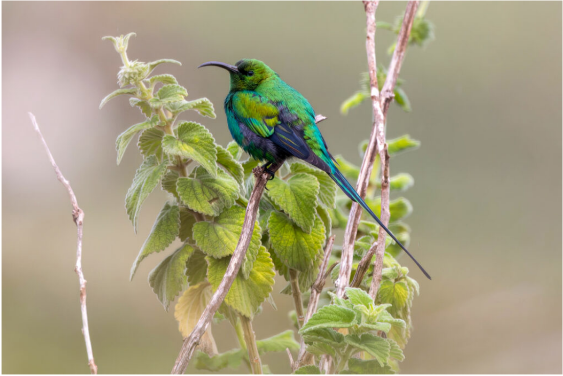
Malachite Sunbird (image by Nik Borrow)