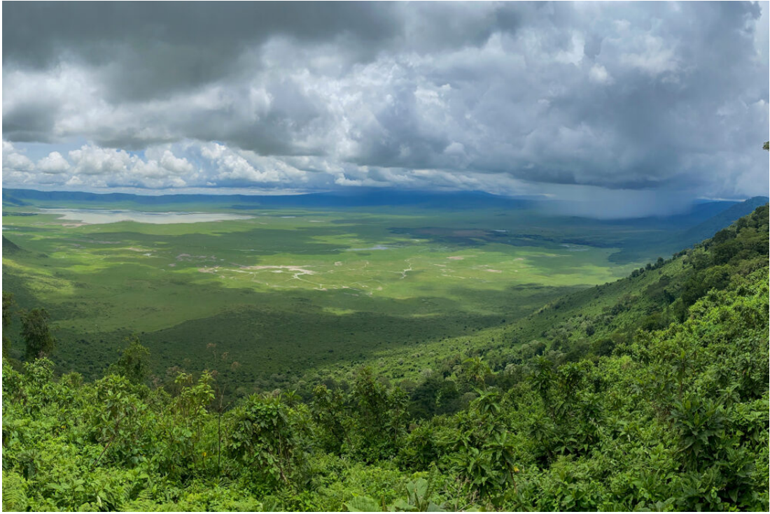
Ngorongoro Crater