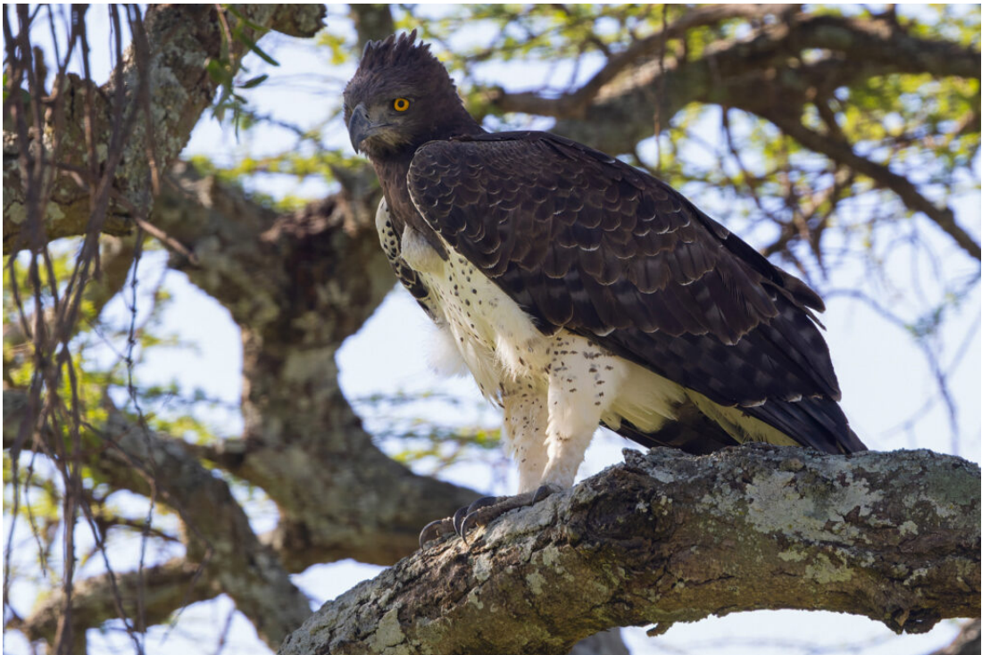
Martial Eagle (image by Nik Borrow)