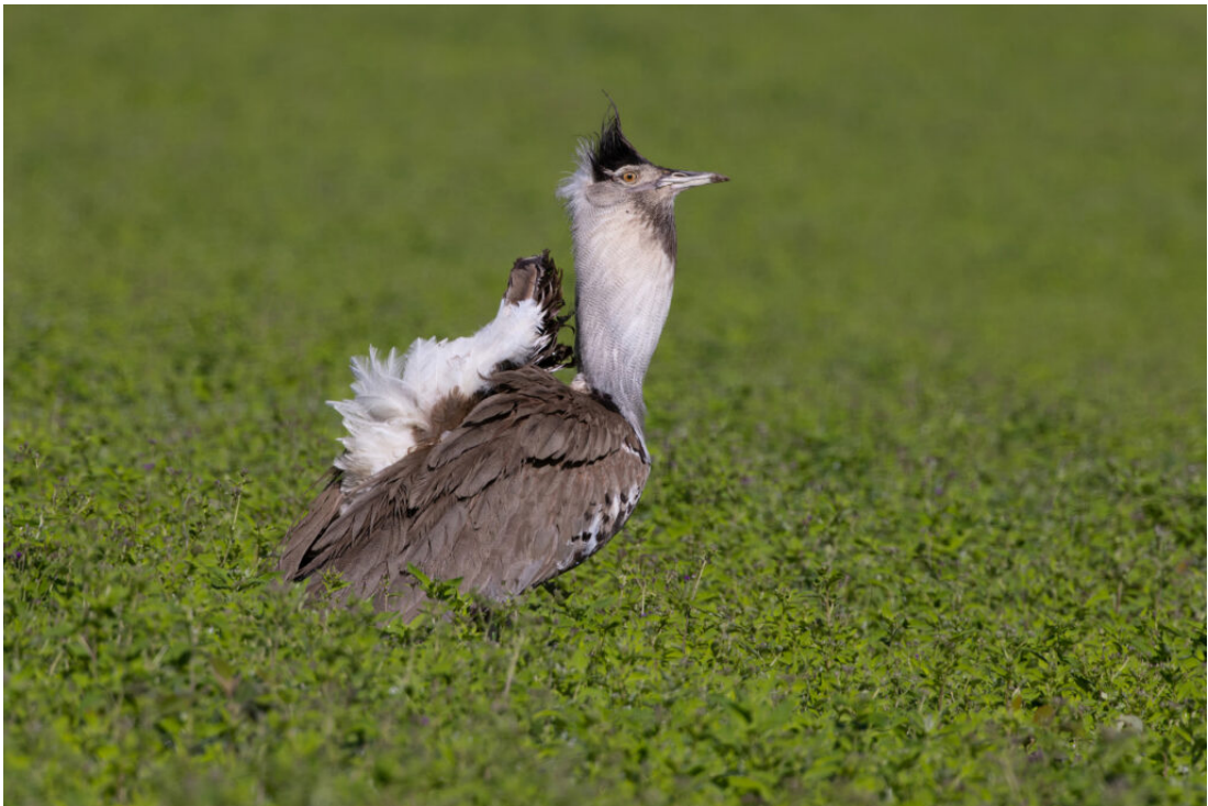
Kori Bustard