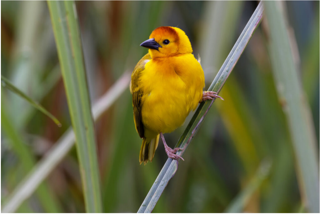
Taveta Golden Weaver