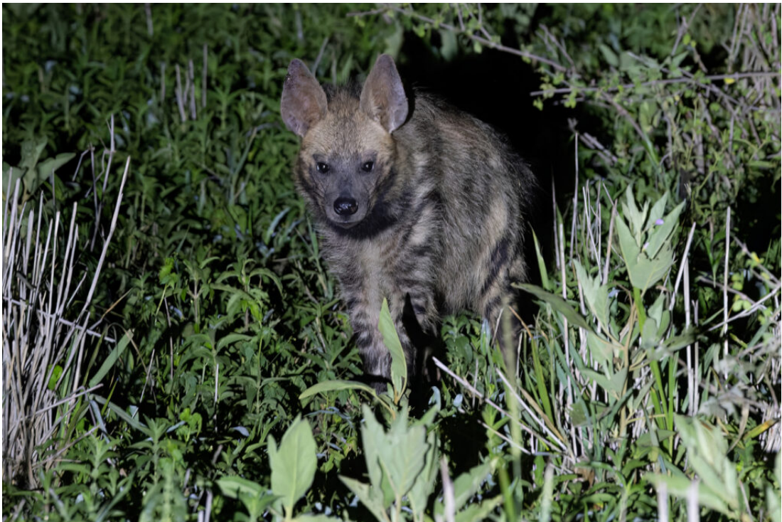
Striped Hyena