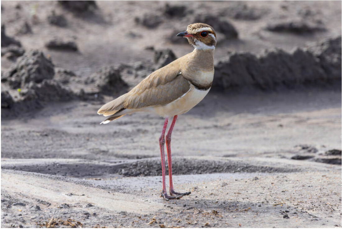
Bronze-winged Courser