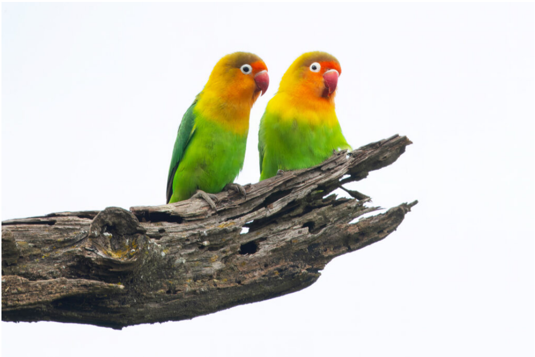
Fischer's Lovebird