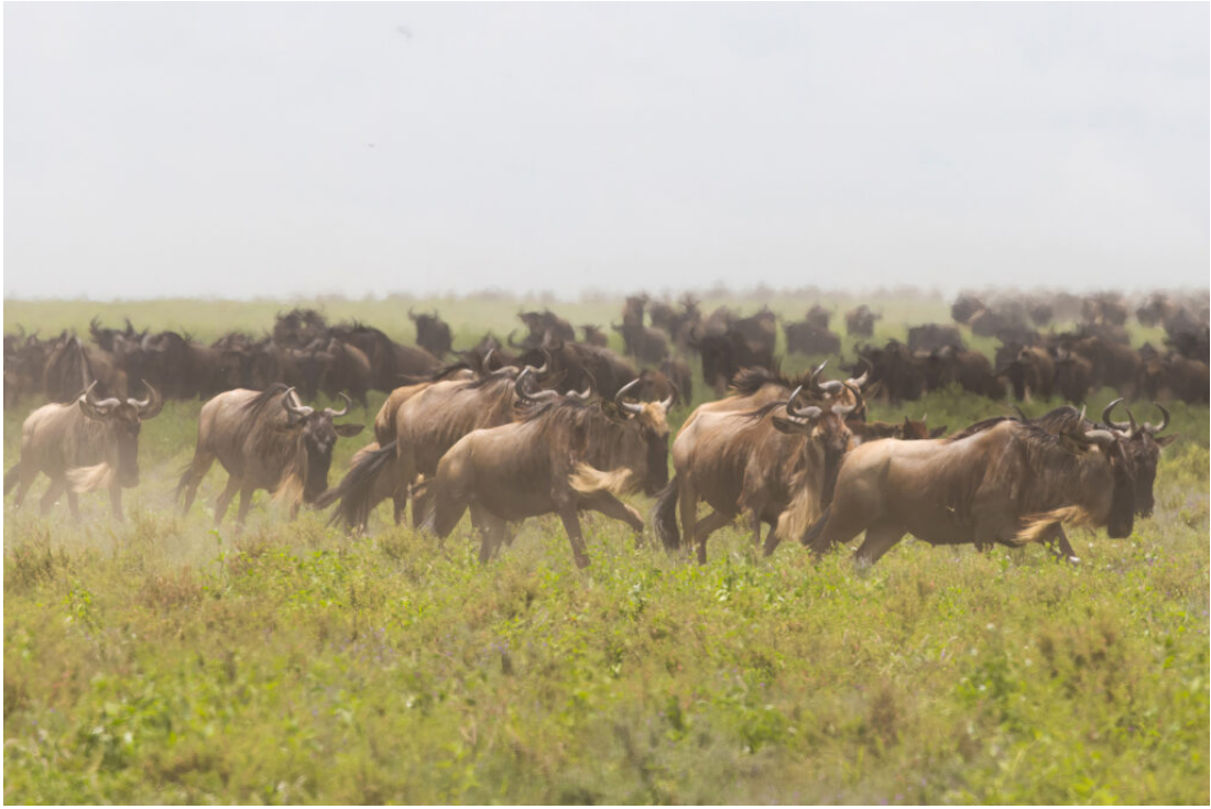
Serengeti [Western] White-bearded Wildebeest (image by Nik Borrow)