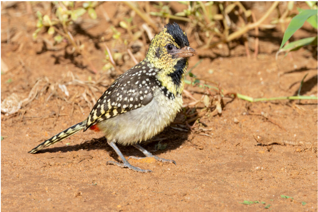
Emin's Barbet