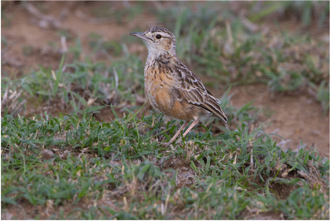
Beesley's Lark (image by Nik Borrow)