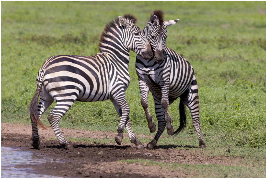
Plains Zebra