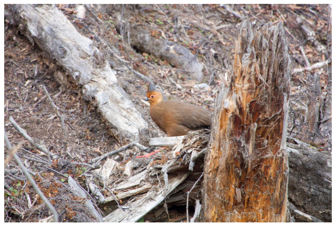
female Blood Pheasant