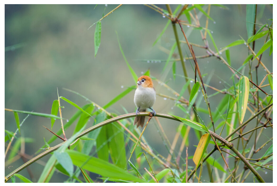
Pale-billed Parrotbill