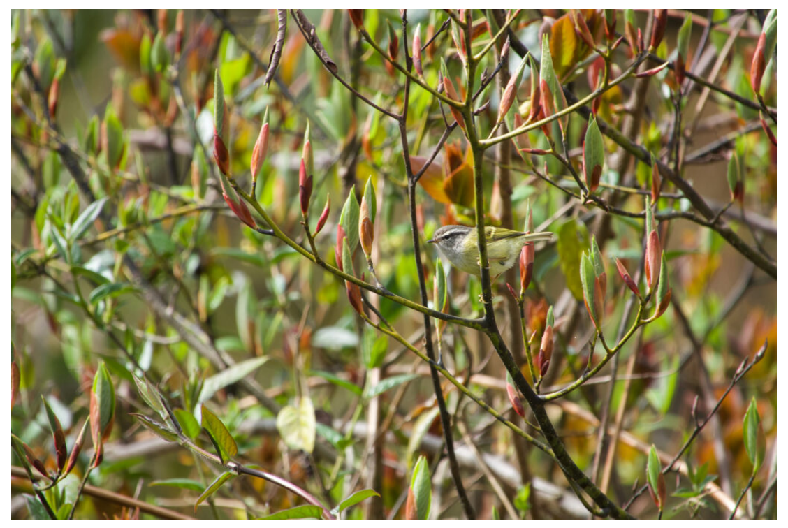
Ashy-throated Warbler (image by Craig Robson)