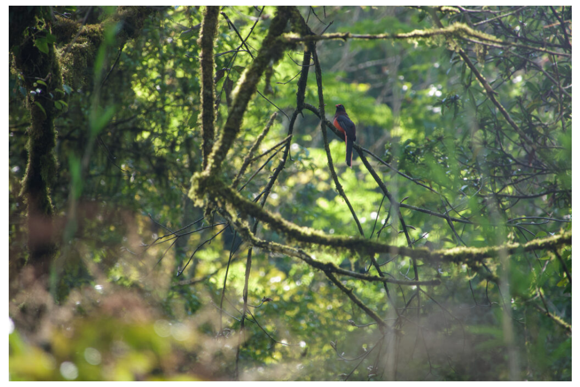
Ward's Trogon