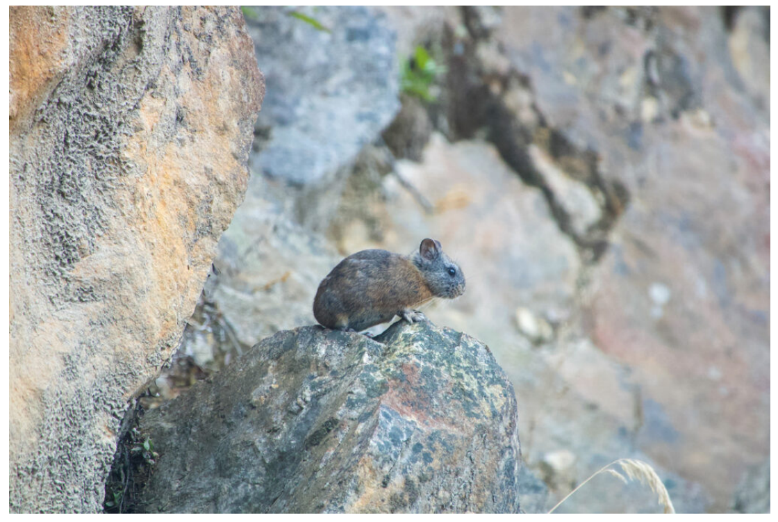
Moupin Pika