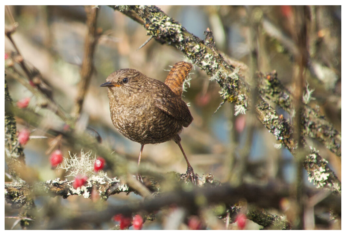
Eurasian Wren