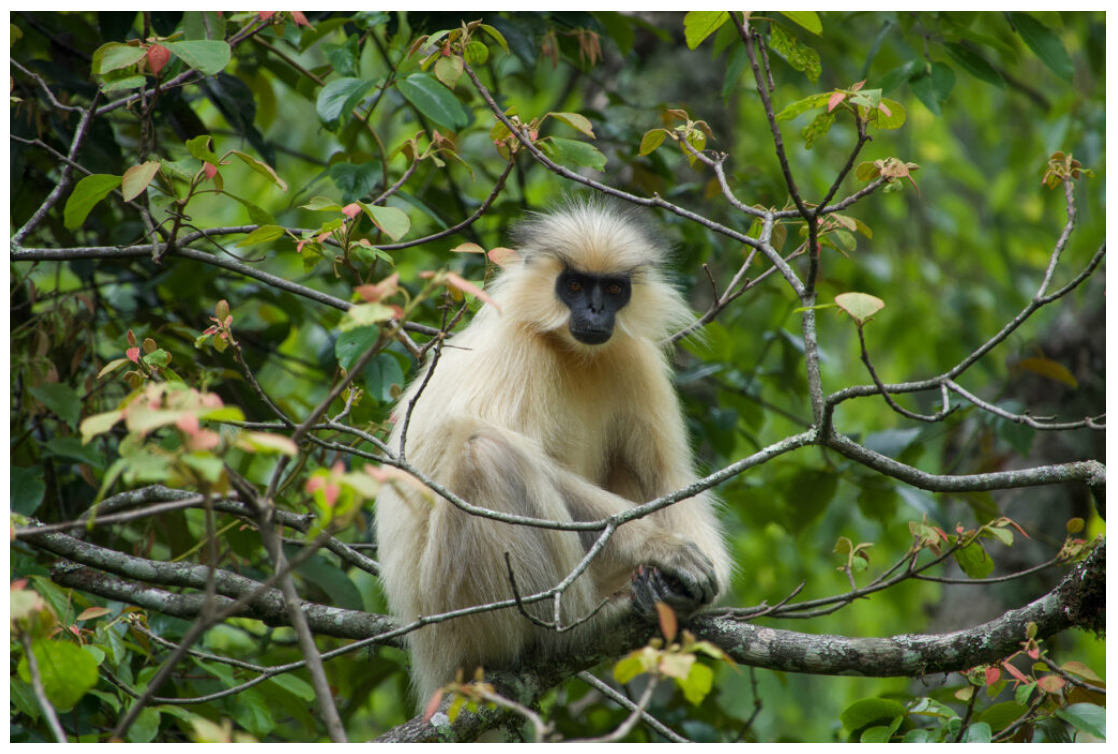
Gee's Golden Langur