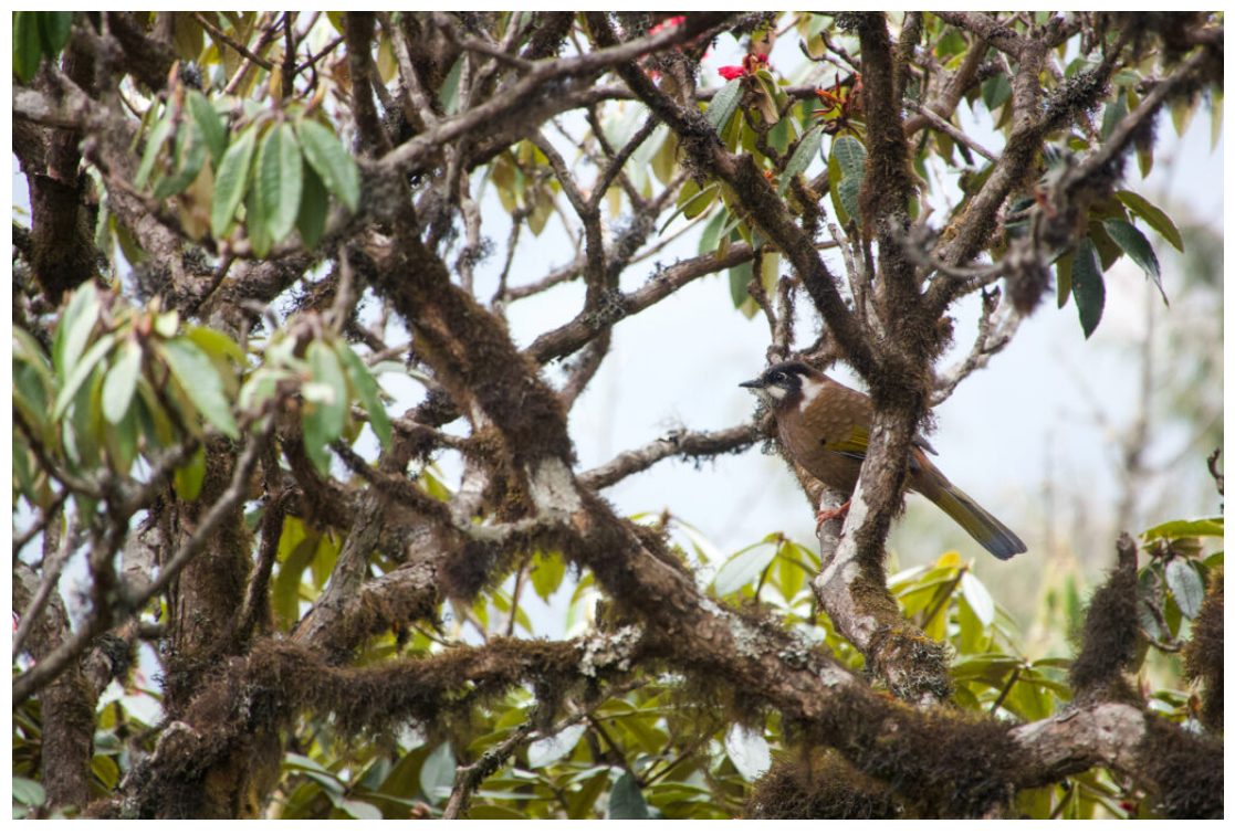
Black-faced Laughingthrush