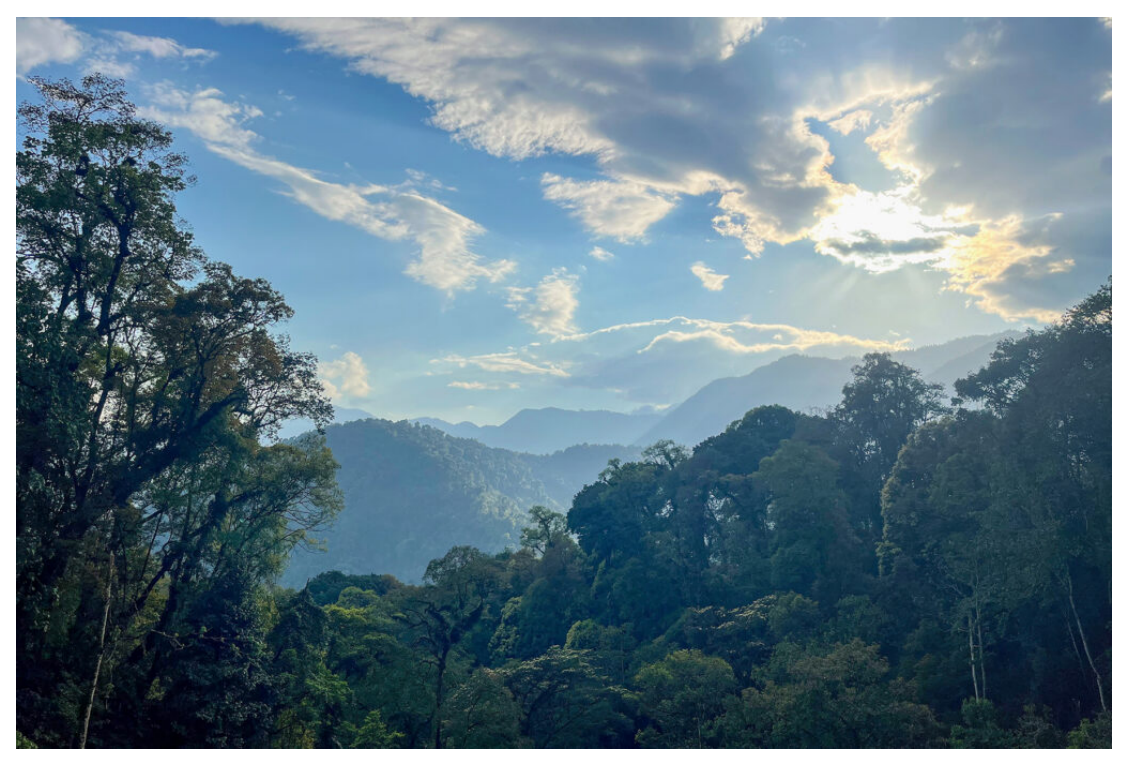
Lingmethang Road