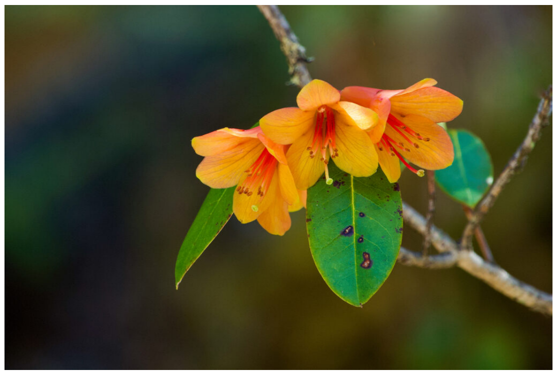
Rhododendron cinnabarinum