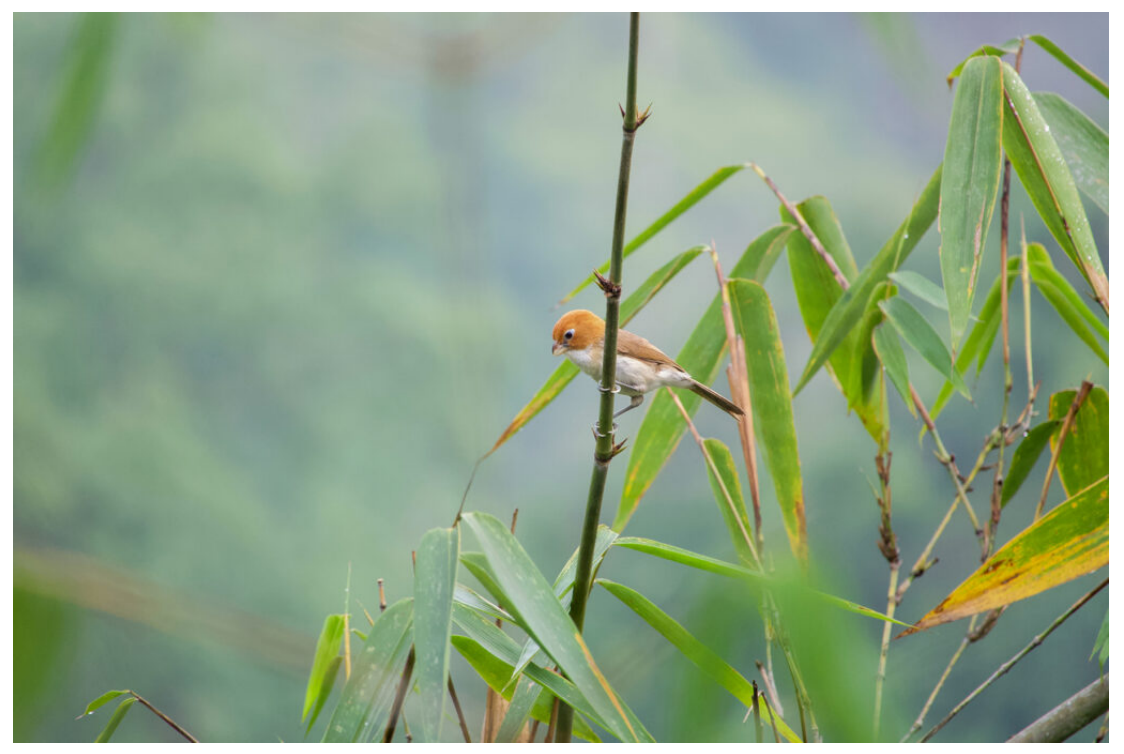
White-breasted Parrotbill