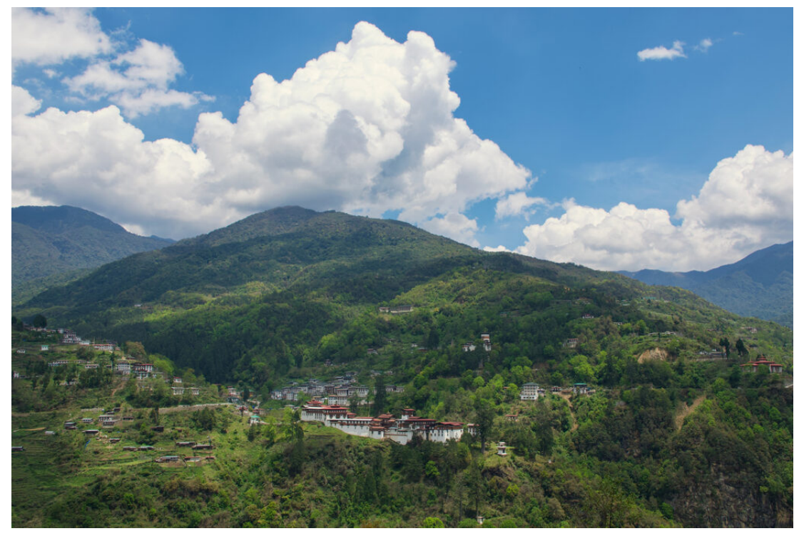
Trongsa Dzong