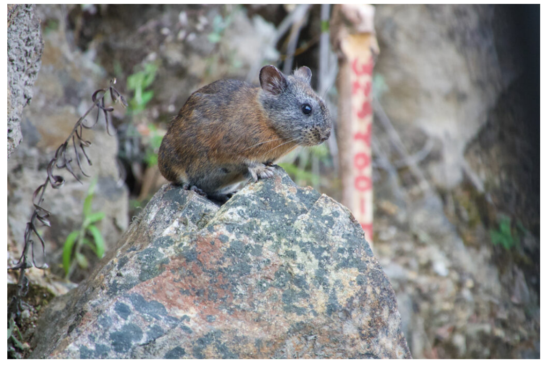
Moupin Pika