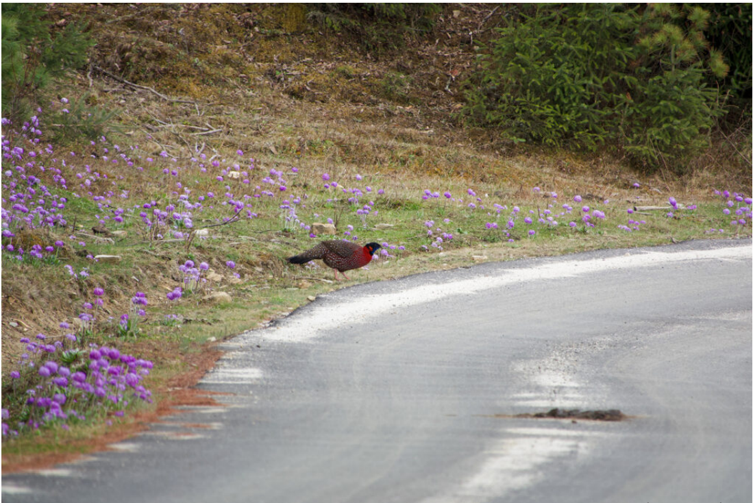
Satyr Tragopan (image by Craig Robson)

Marbled White Moth Nyctemera adversata Below Batasey Camp. Hawaiian Beet Webworm Moth Spoladea recurvalis Lingmethang Road. PLANTS Wingless Ainsliaea Ainsliaea aptera Nepal Alder Alnus nepalensis Ringed Begonia Begonia annulata Primrose Bryocarpum himalaicum Rockspray Cotoneaster Cotoneaster microphyllus Wild Turmeric Cucurma aromatica Lokta Daphne bholua Fireglow Spurge Euphorbia griffithii Paro etc. Himalayan Strawberry Fragaria nubicola Abundant. Taiwan Pieris Pieris formosa In the Blue Pine forests along the Dochu La Road. Blue Pine Pinus wallichiana Drumstick Primrose Primula denticulata Abundant. Candelabra Primrose Primula smithiana Chele La road, Paro etc. Primrose Primula griffithii Chele La road. Tree Rhododendron Rhododendron arboreum Cinnabar Rhododendron Rhododendron cinnabarinum Griffith's Rhododendron Rhododendron griffithianum Lindley's Rhododendron Rhododendron lindleyi Sometimes epiphytic.