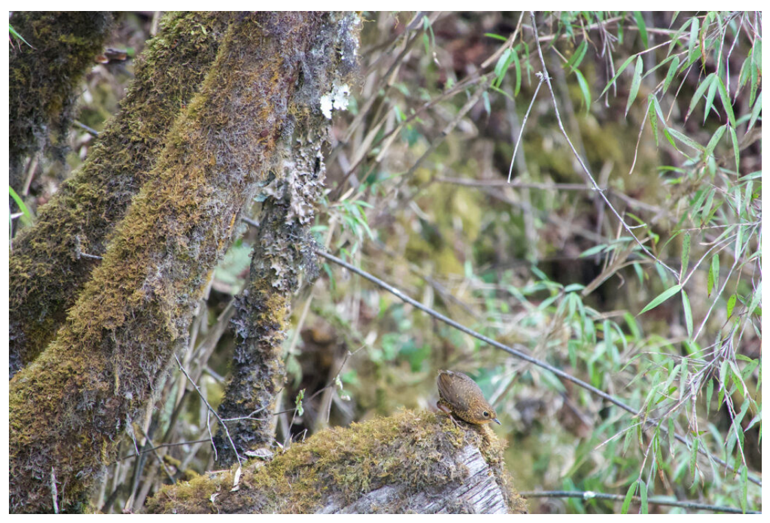
Scaly-breasted Cupwing