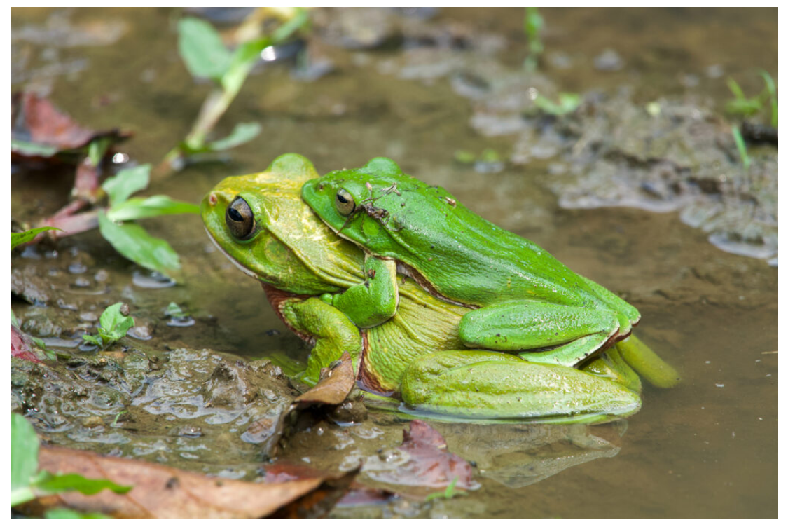
White-lipped Treefrog