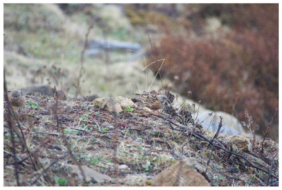
Altai Accentor