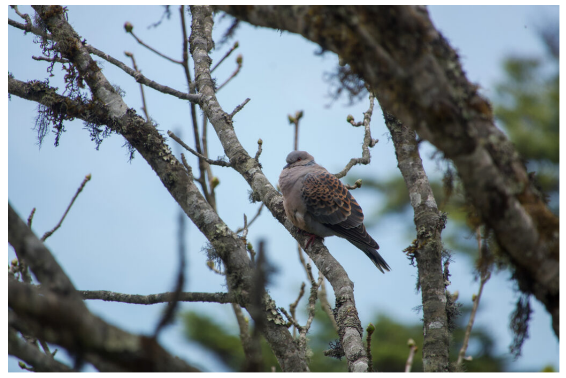
Oriental Turtle Dove