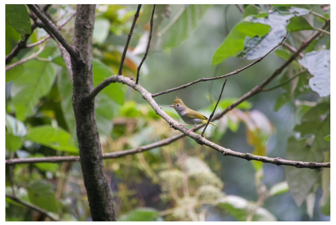
White-bellied Erpornis