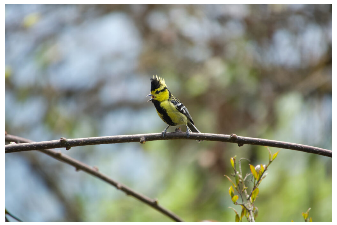
Yellow-cheeked Tit