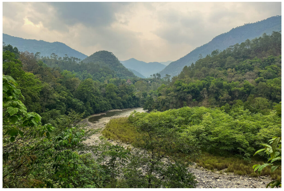
Tingtibi (image by Craig Robson)