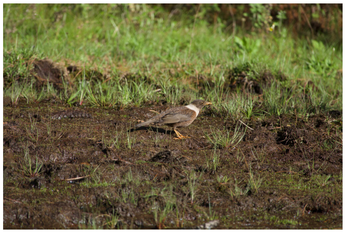
White-collared Blackbird female