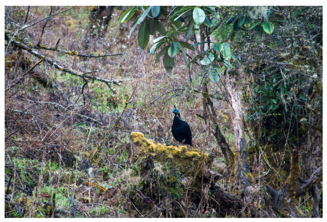
Himalayan Monal