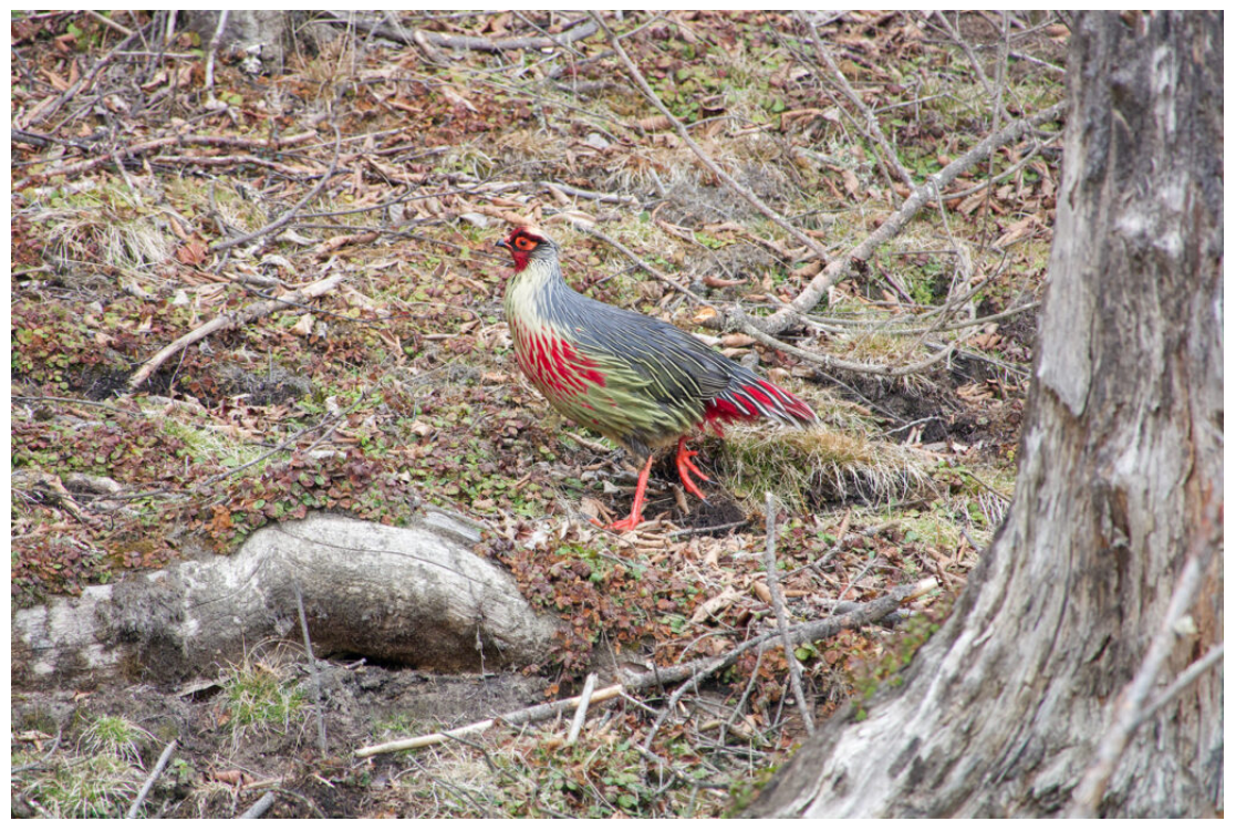
Blood Pheasant