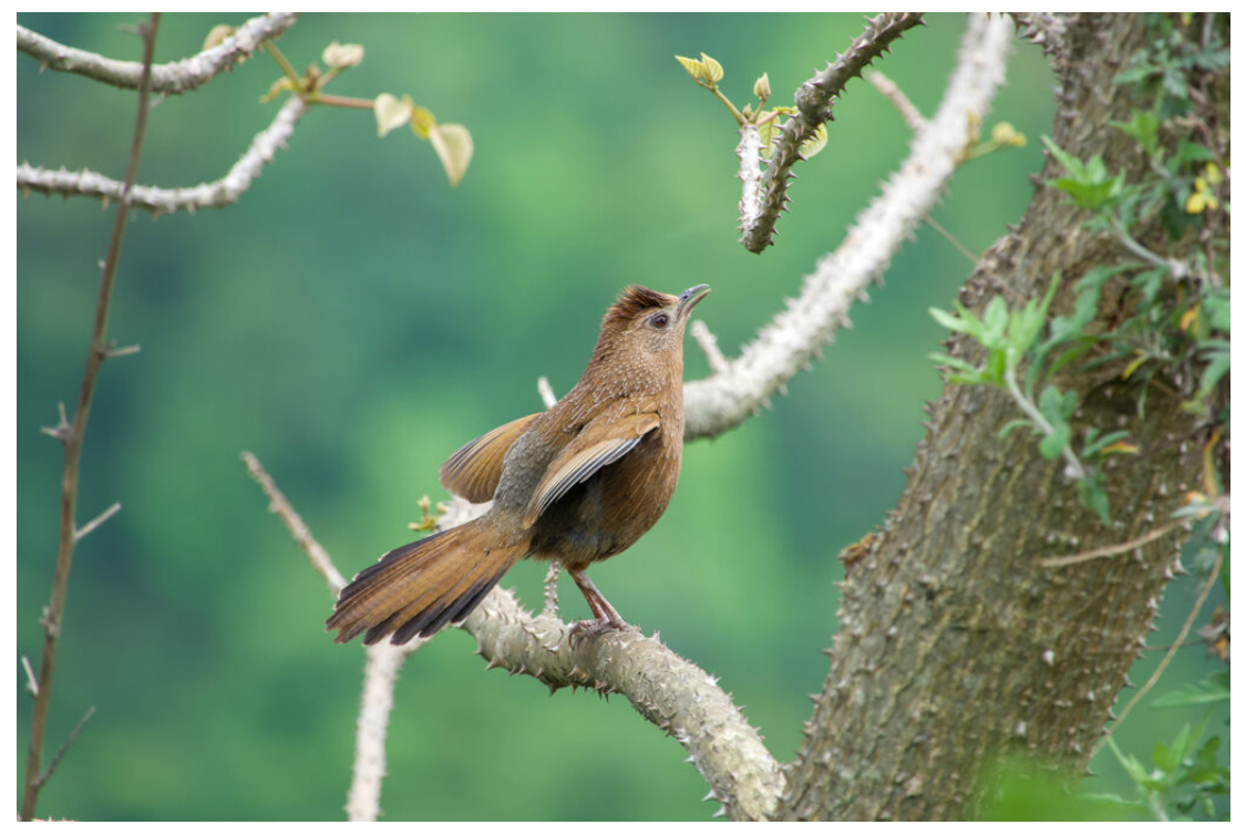
Bhutan Laughingthrush