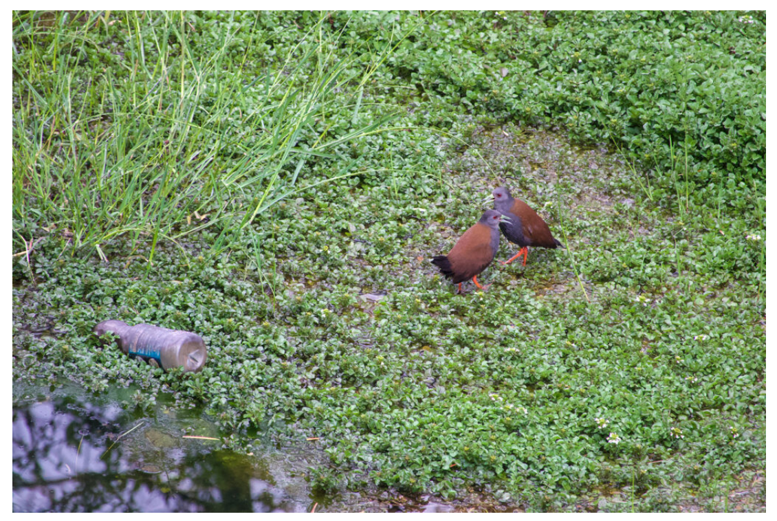
Black-tailed Crake