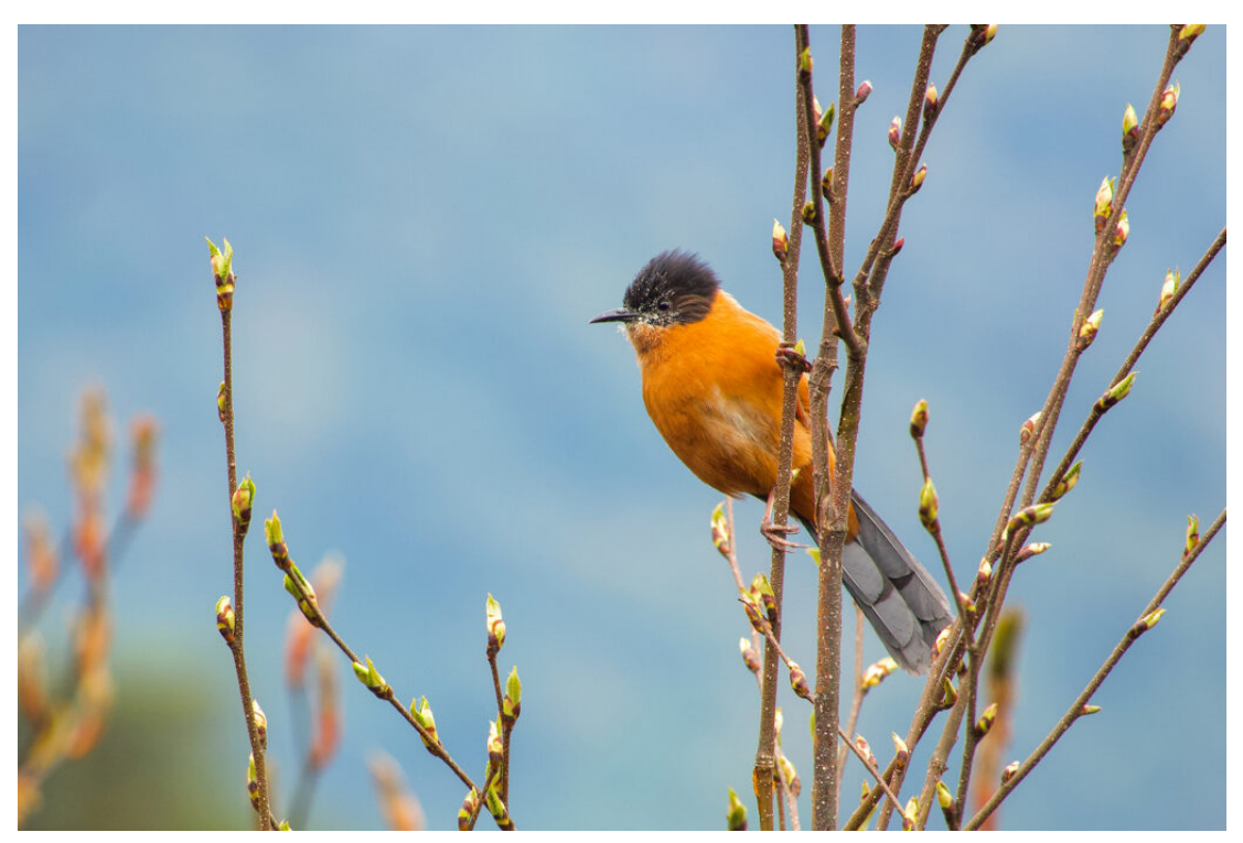
Rufous Sibia