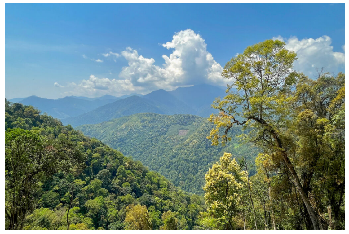
Lingmethang Road (image by Craig Robson)