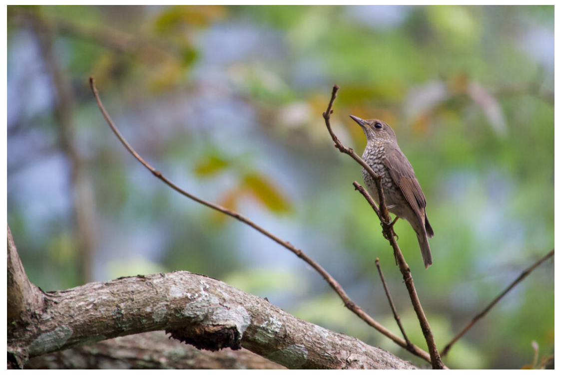
Blue-capped Rock Thrush