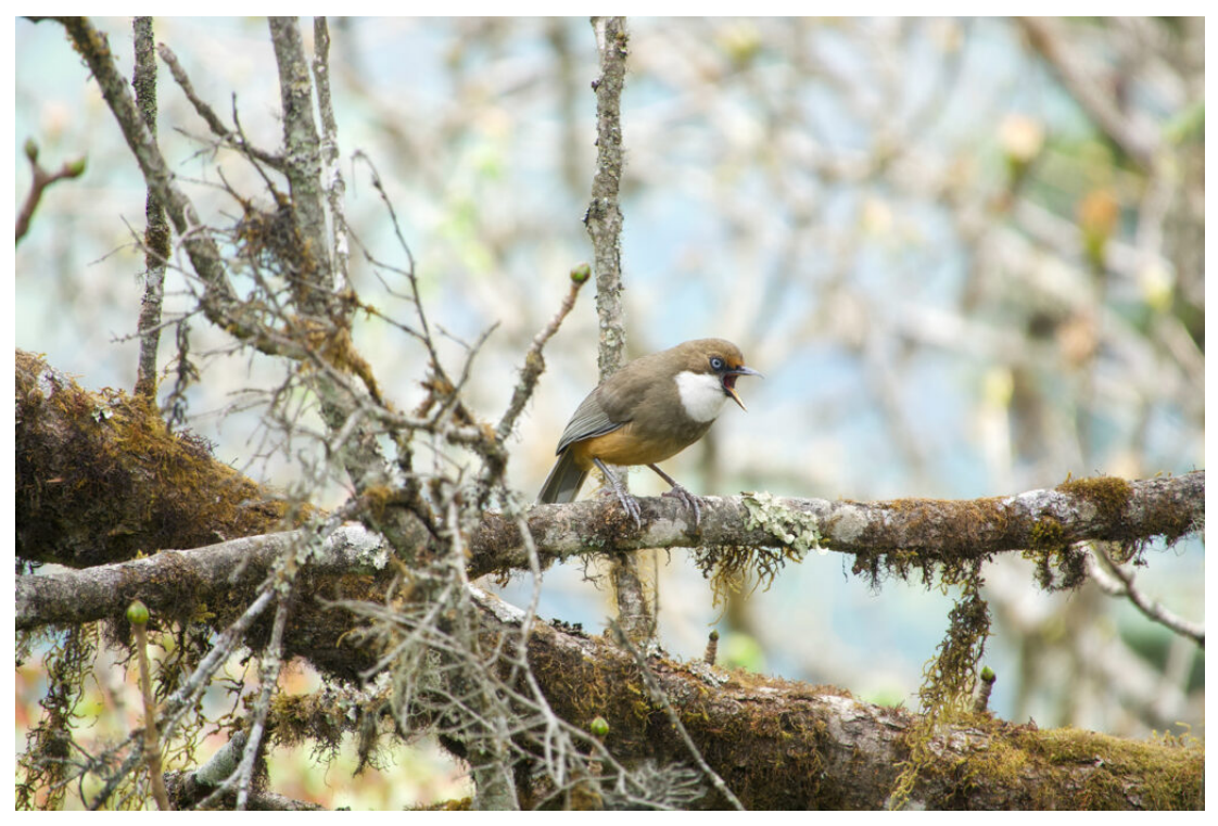
White-throated Laughingthrush