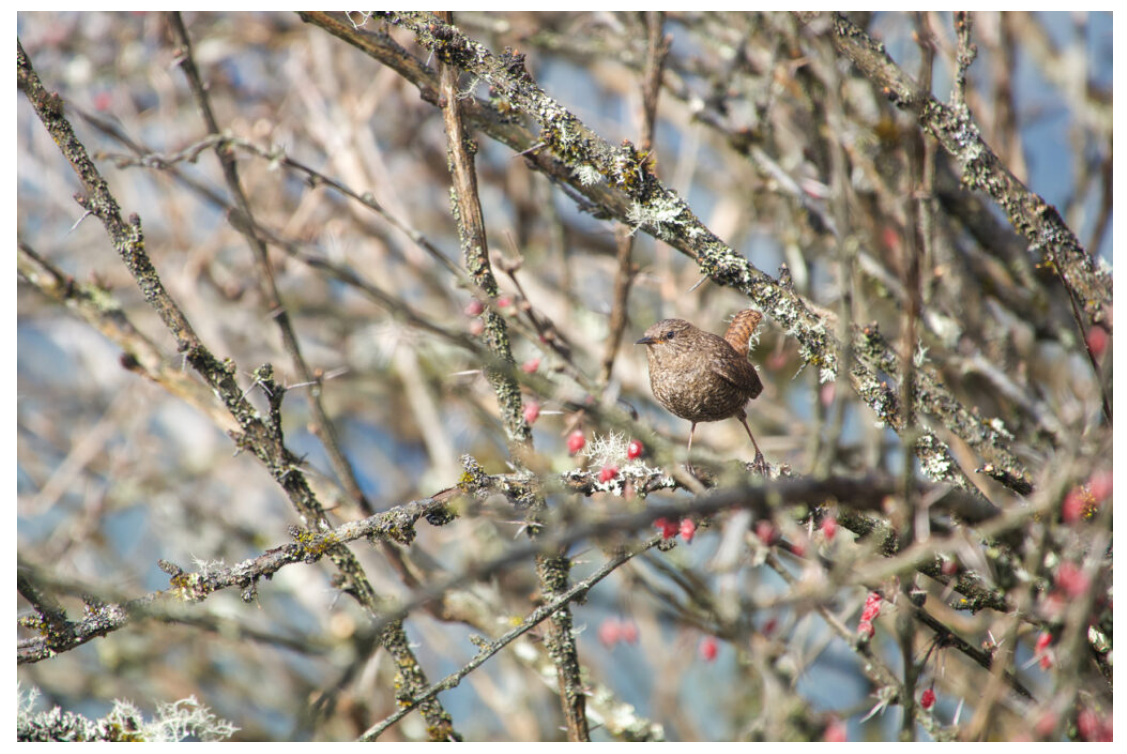
Eurasian Wren