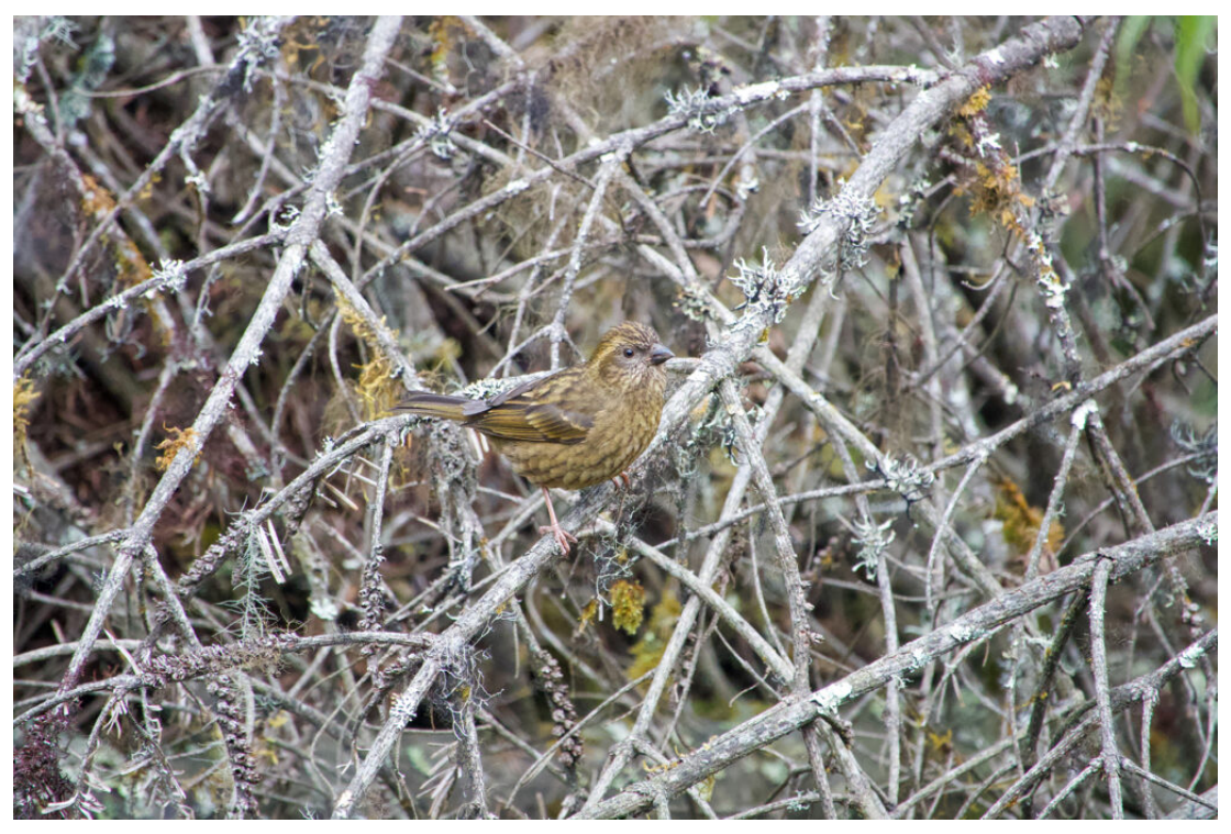
Dark-rumped Rosefinch