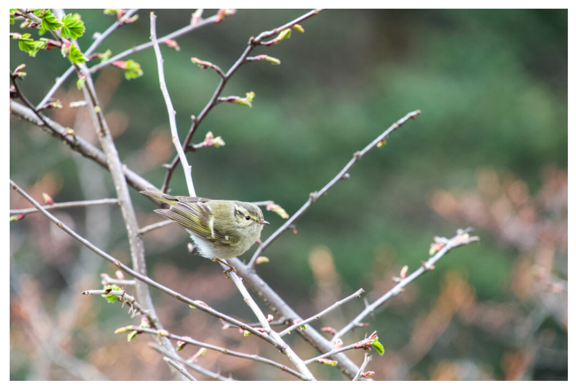
Lemon-rumped Warbler