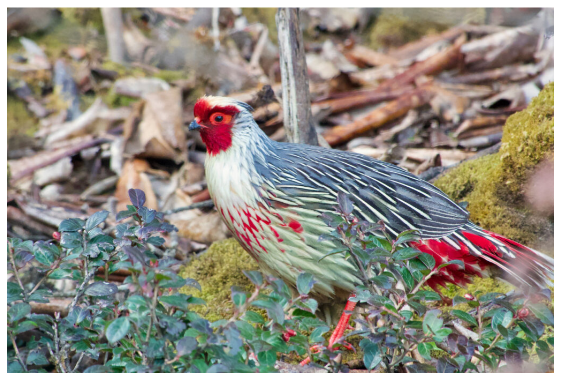
Blood Pheasant