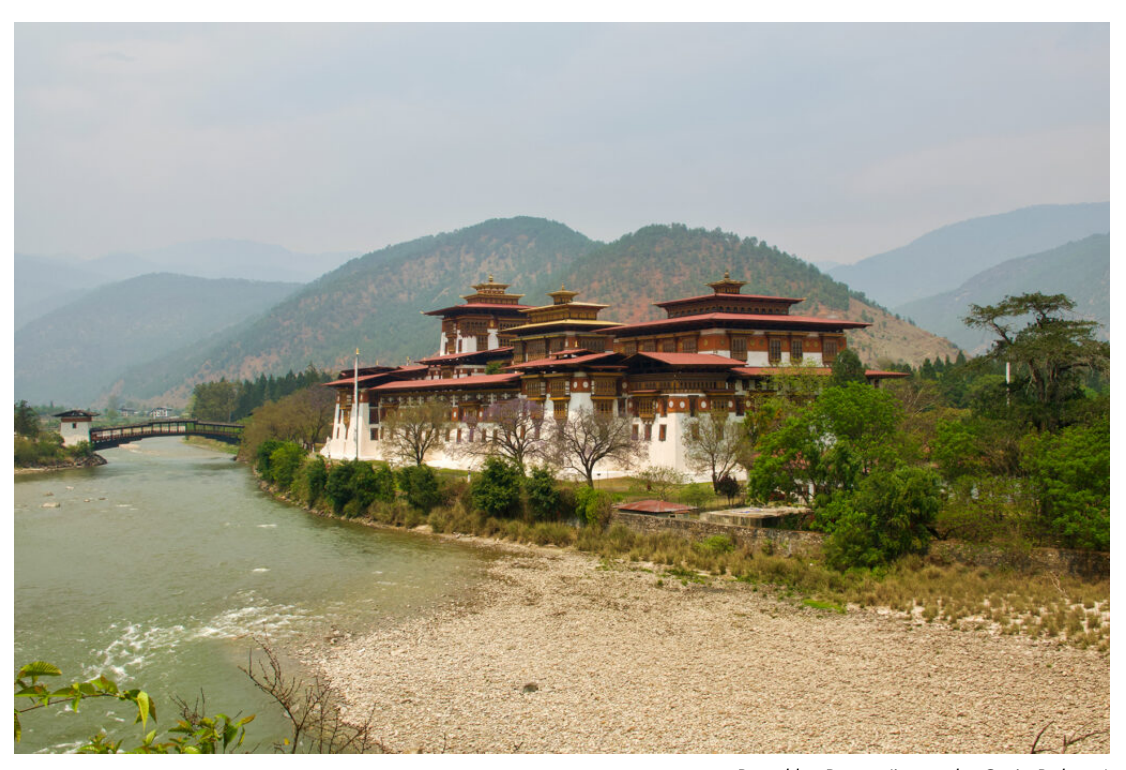
Punakha Dzong