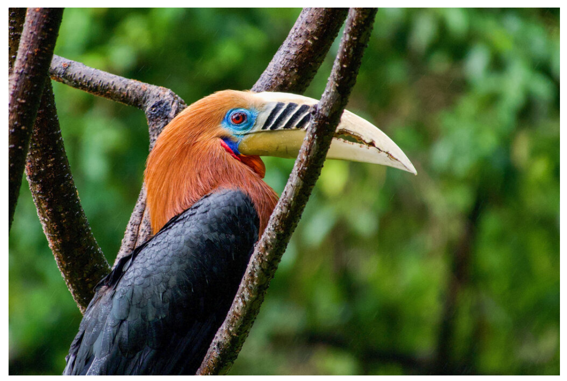
Rufous-necked Hornbill