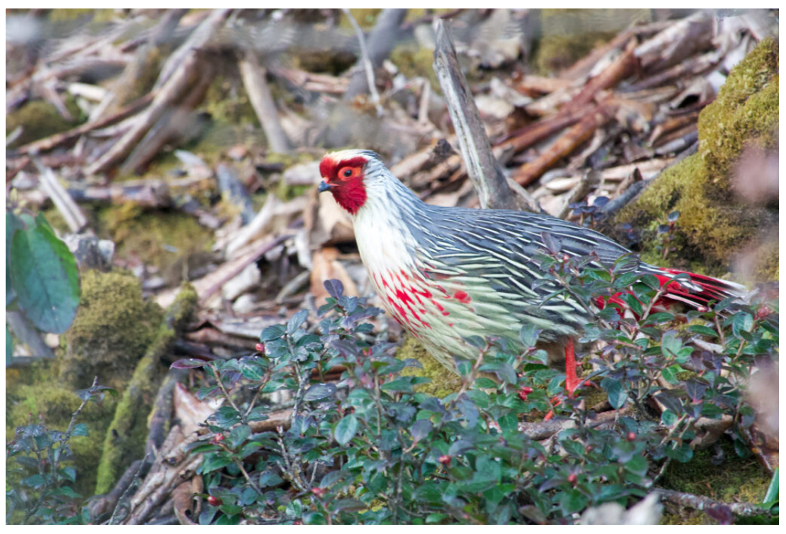
Blood Pheasant