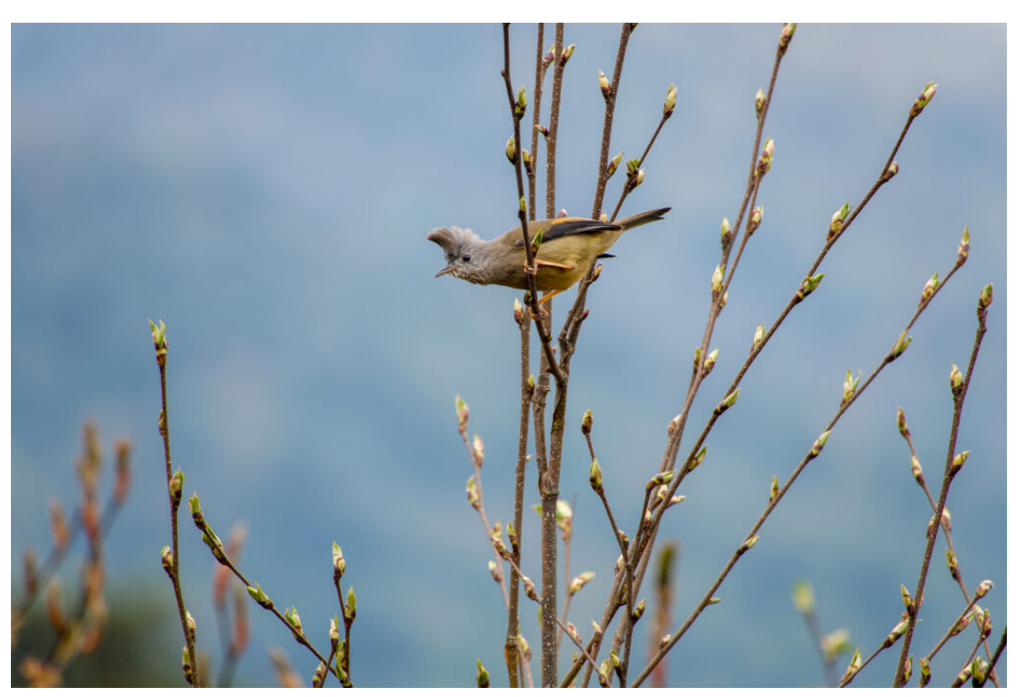
Stripe-throated Yuhina