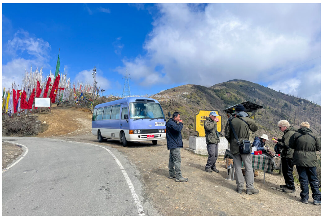
Tea break at Chele La