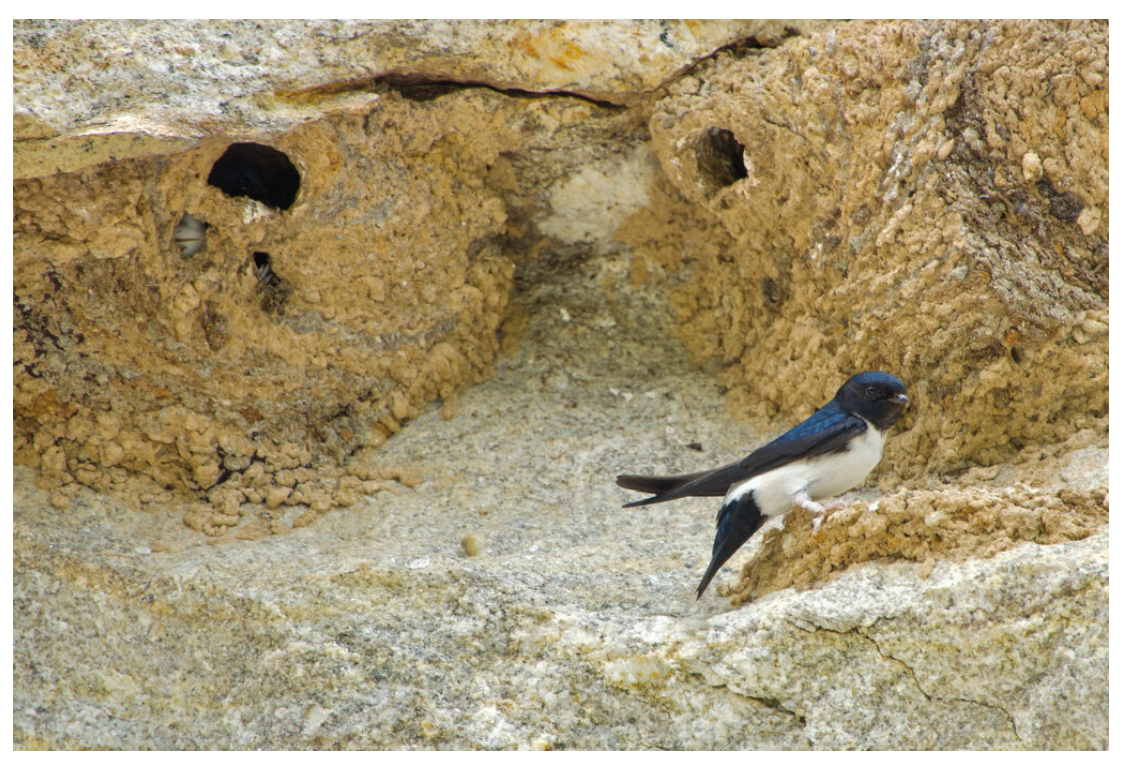
Nepal House Martin