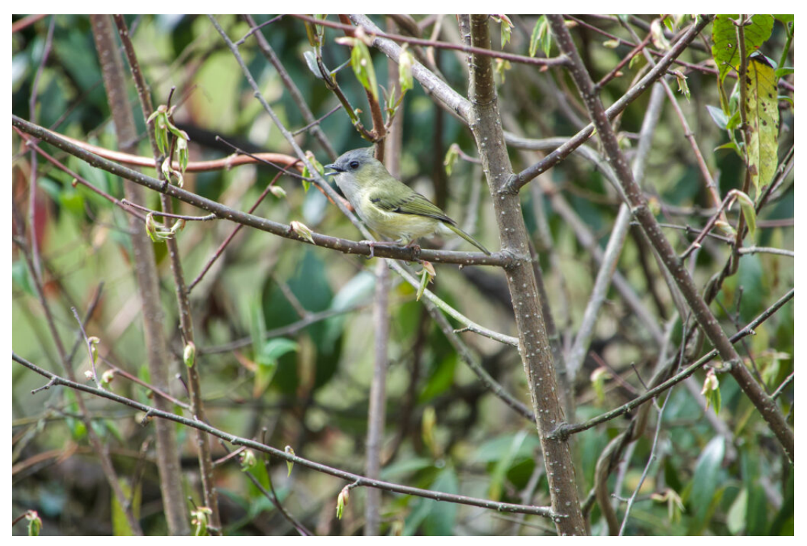
Green Shrike-Babbler