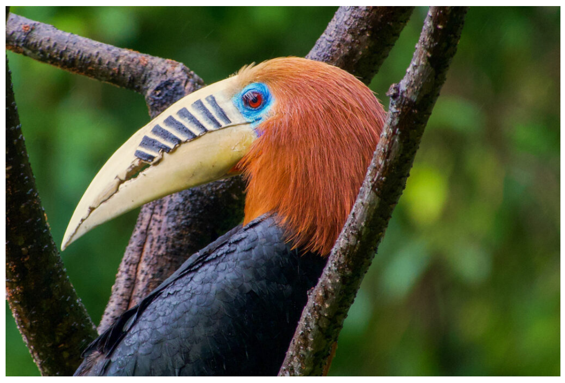
Rufous-necked Hornbill