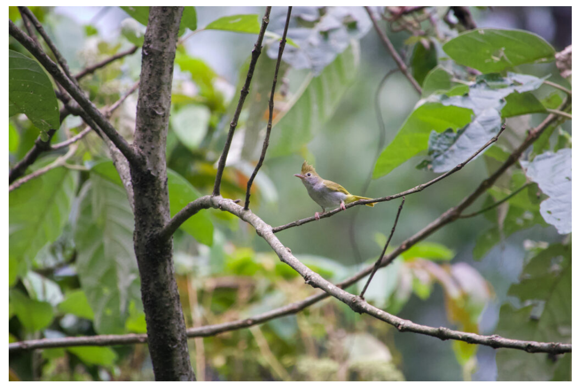
White-bellied Erpornis