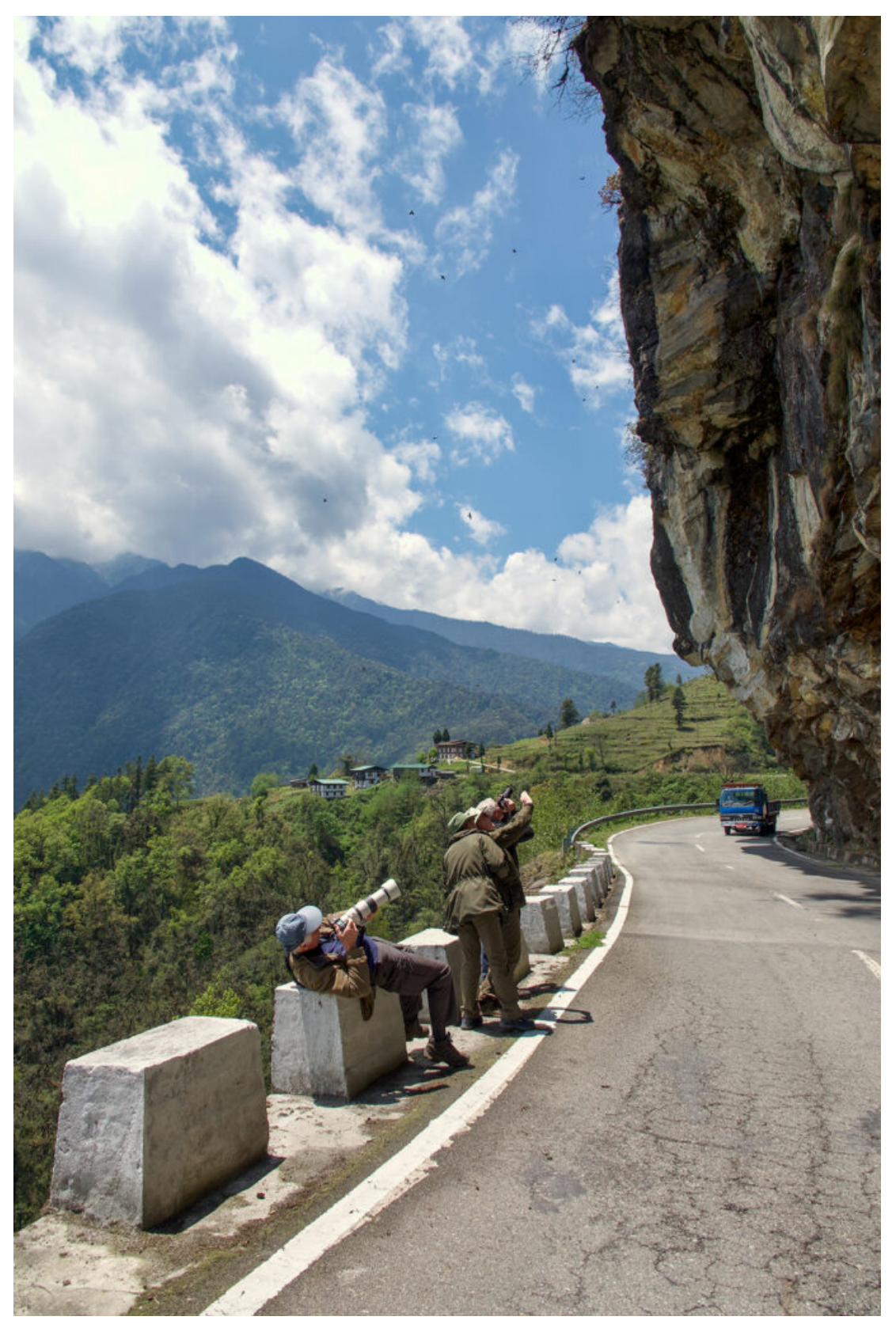
Watching Nepal House Martins