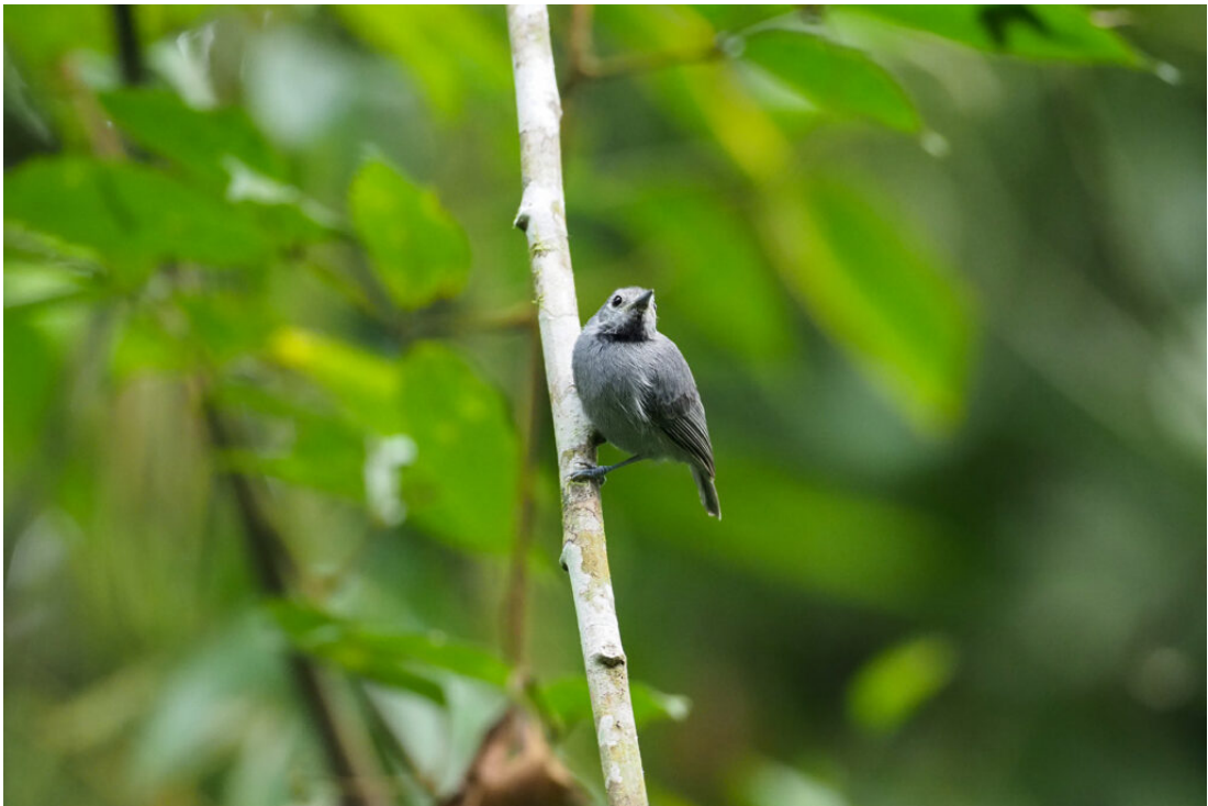
Unicoloured Antwren