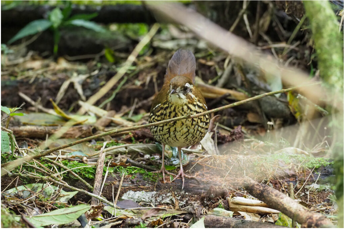
Rufous-tailed Anthrush