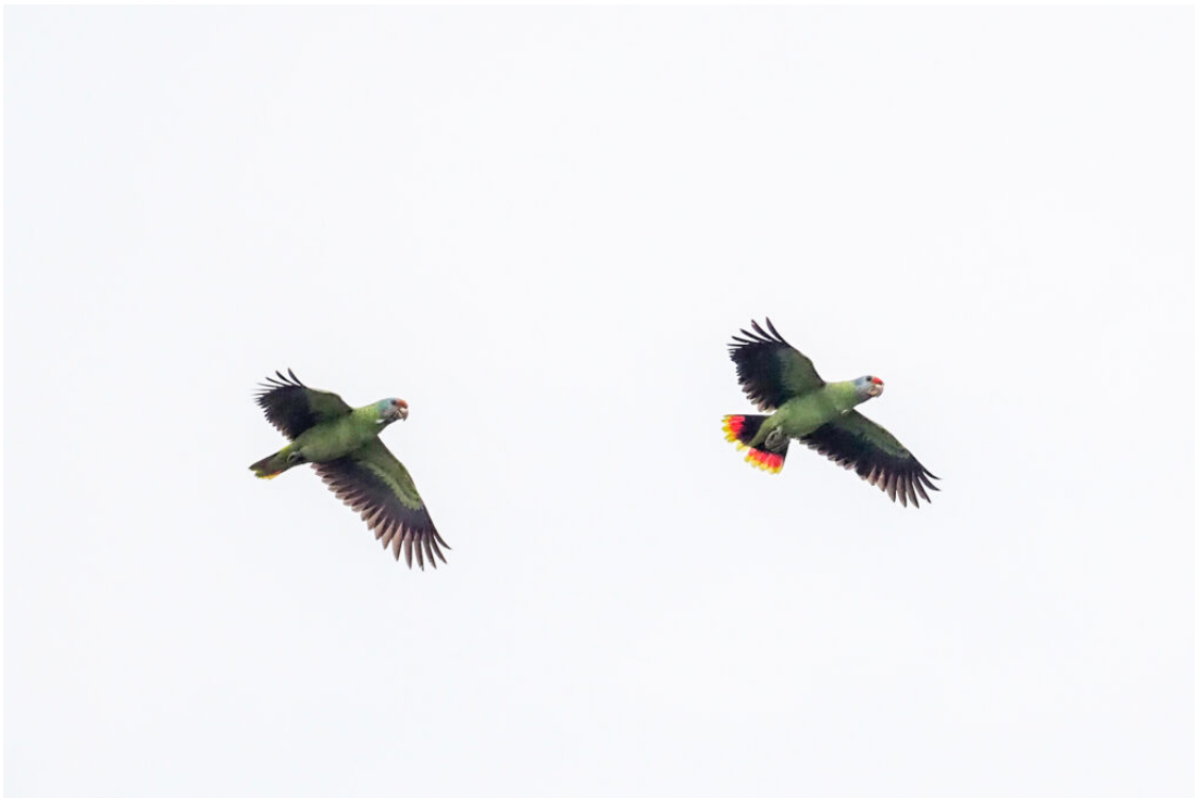
Red-tailed Amazon