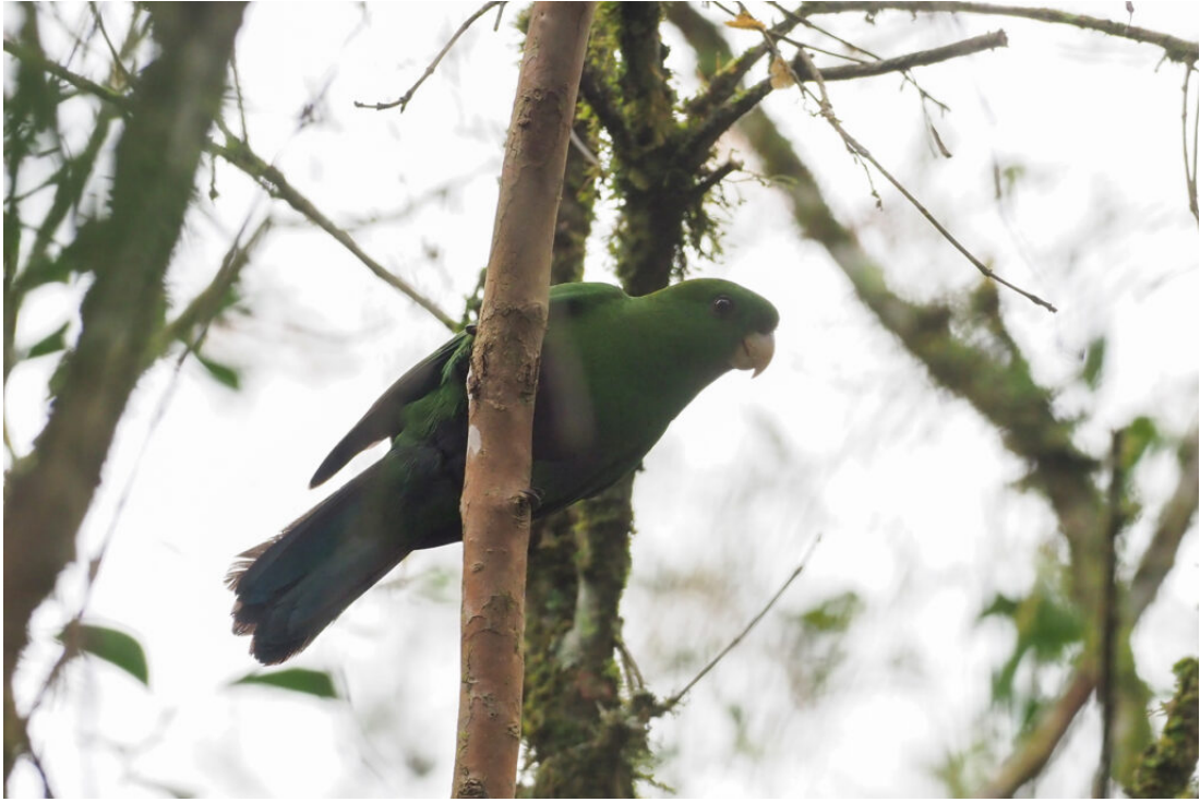
Blue-bellied Parrot