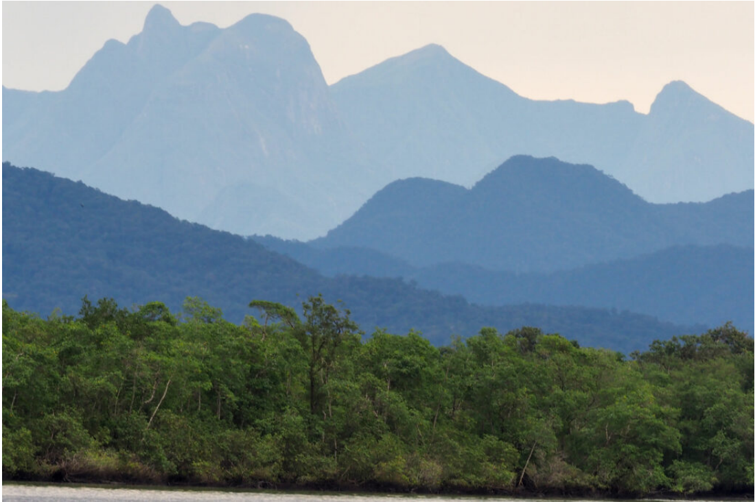
Atlantic Forest, Serra do Mar