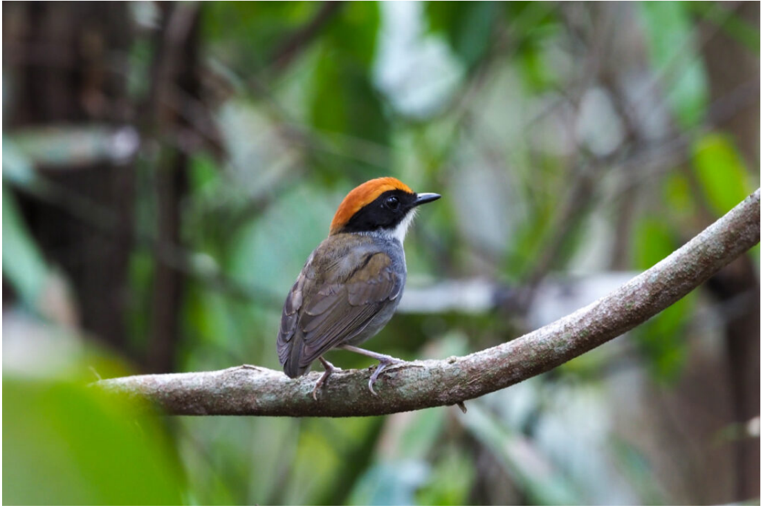
Black-cheeked Gnatcatcher