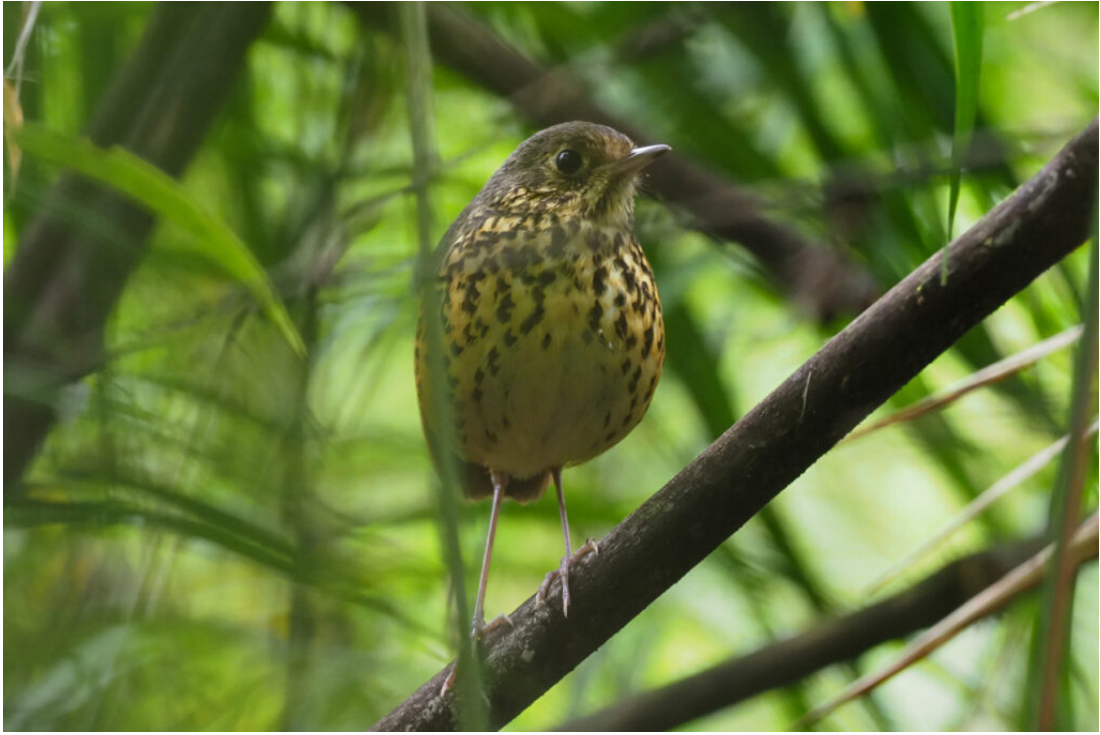
Speckle-breasted Antpitta