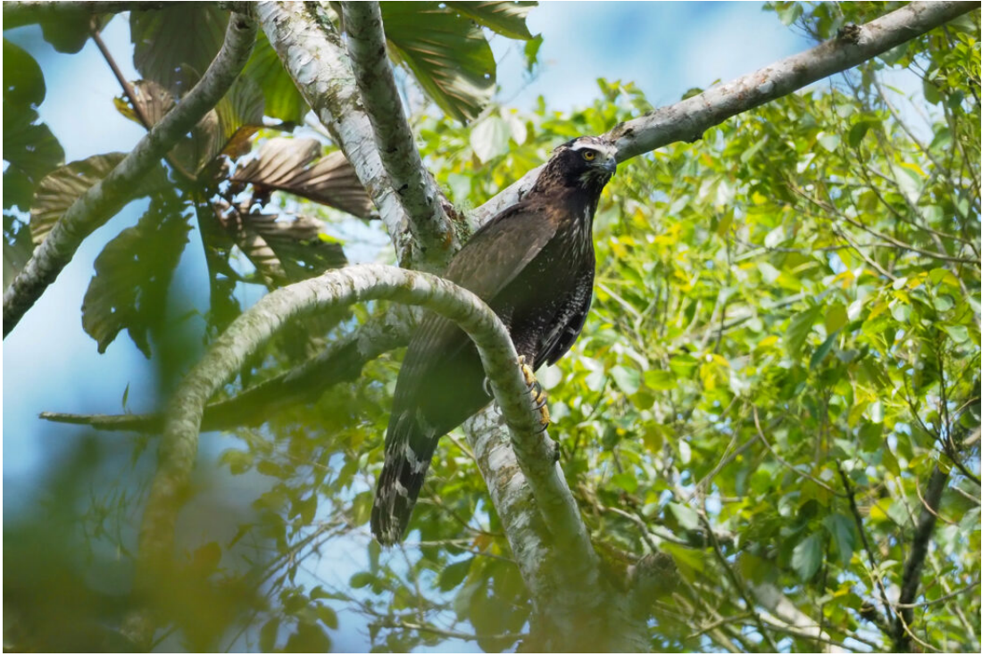
Black Hawk-Eagle