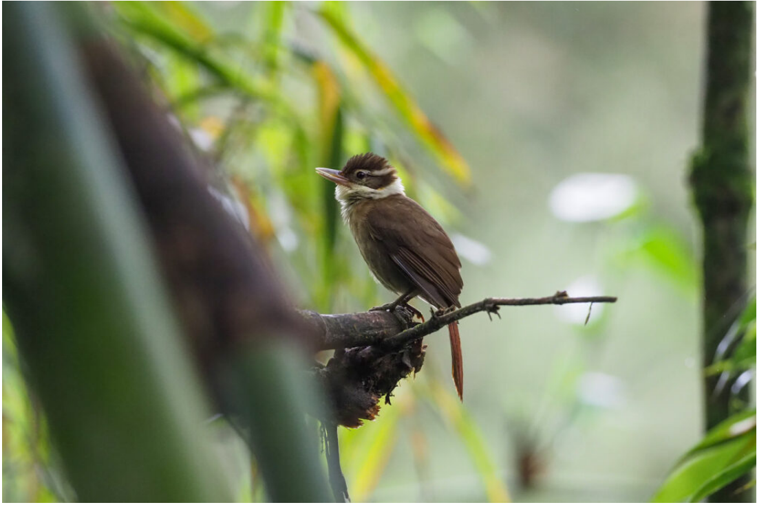
White-collared Foliage-gleaner