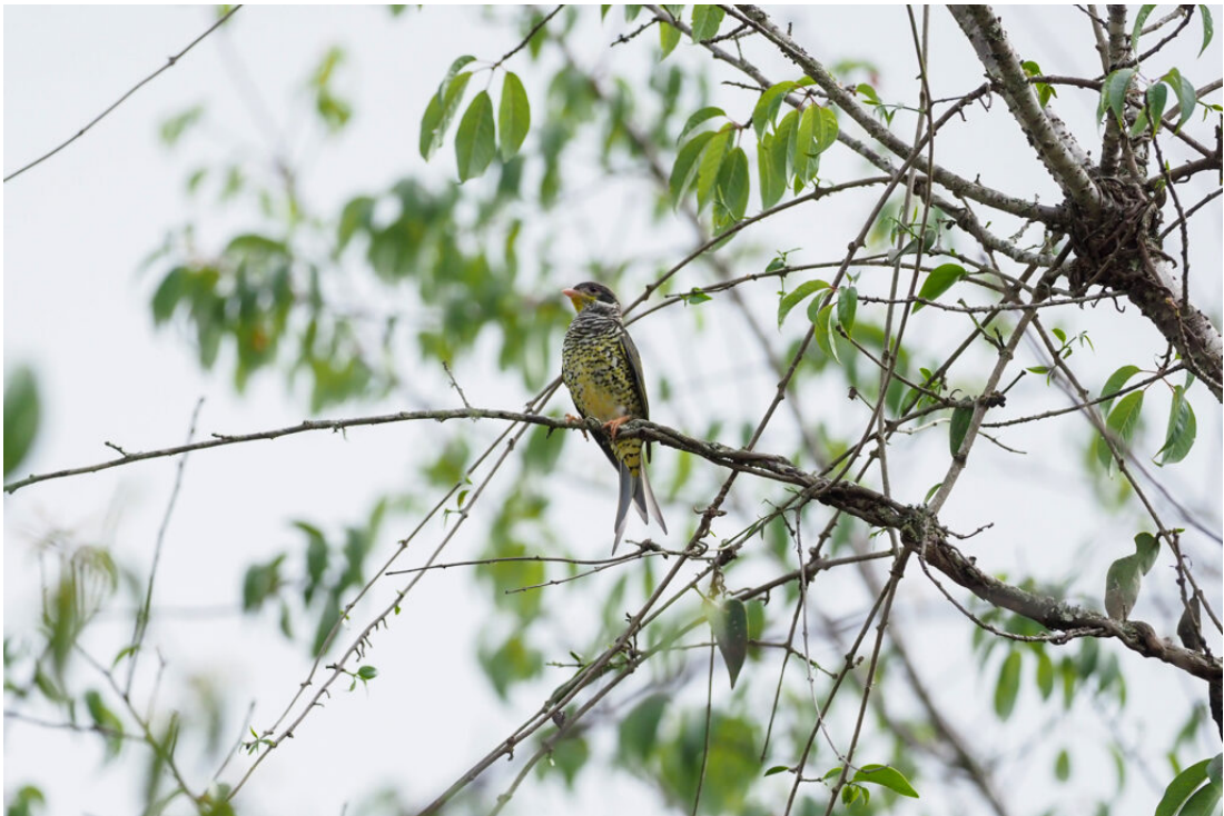
Swallow-tailed Cotinga