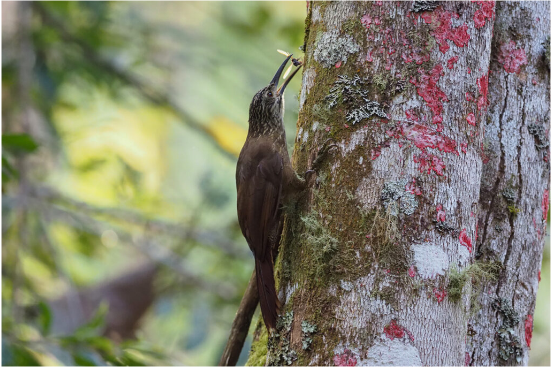
White-throated Woodcreeper