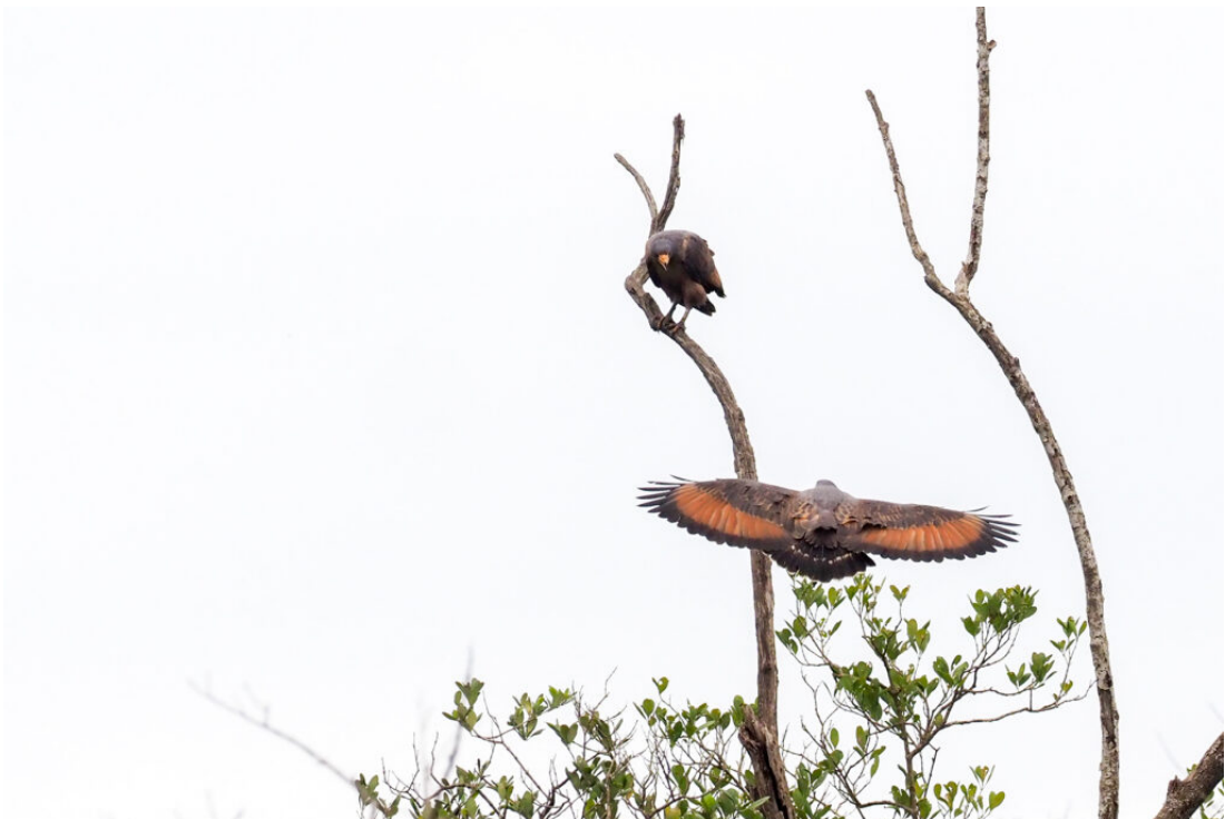
Rufous Crab Hawk