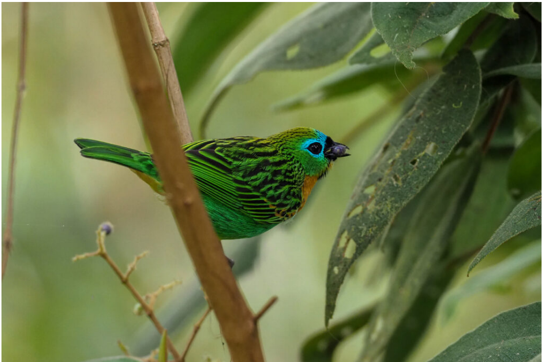
Brassy-breasted Tanager