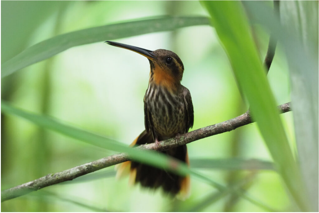
Saw-billed Hermit