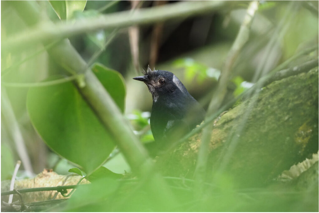
Slaty Bristlefront