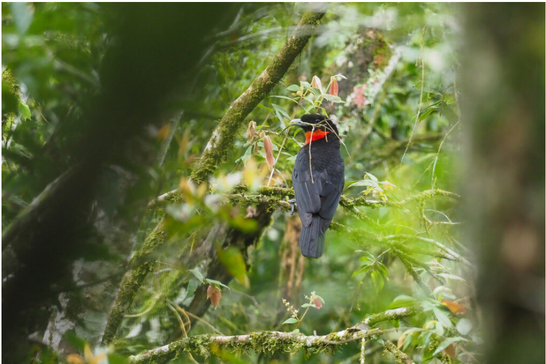
Red-ruffed Fruitcrow