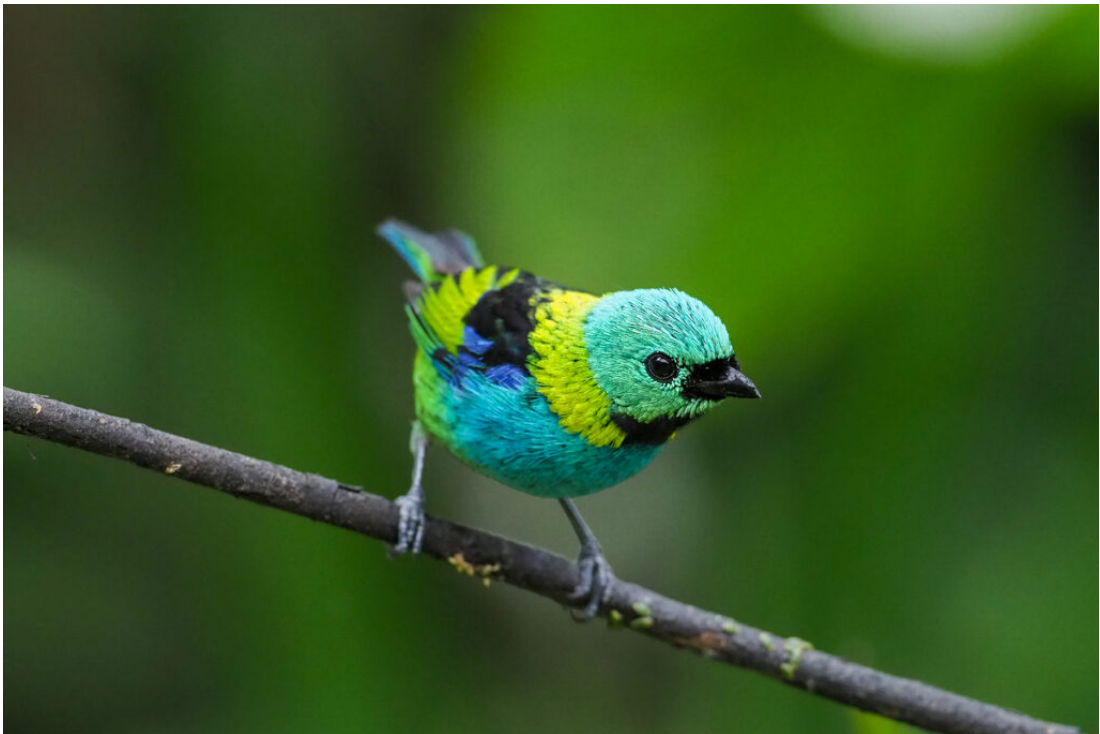
Green-headed Tanager