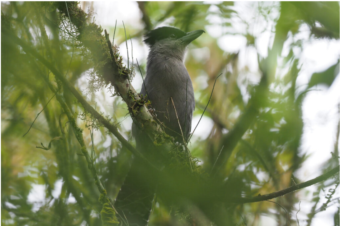
Giant Antshrike