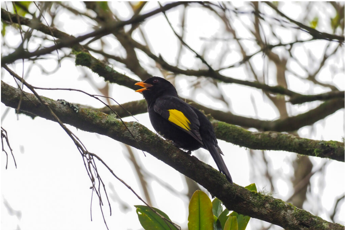
Black-and-gold Cotinga