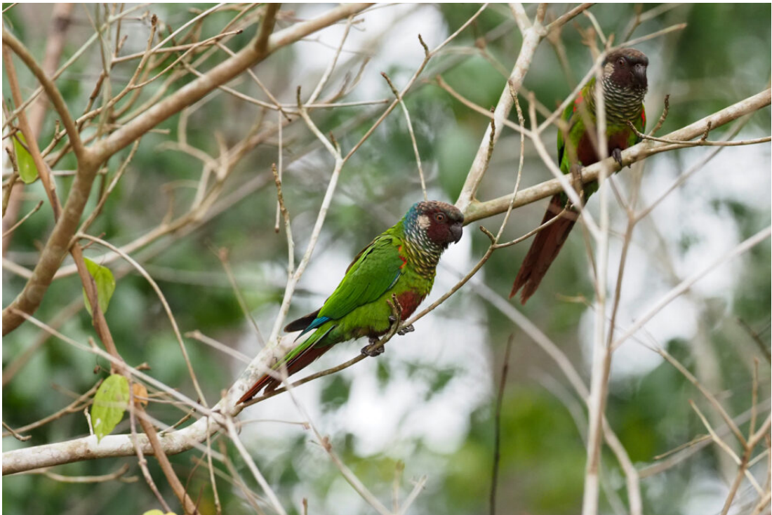
White-eared Parakeet