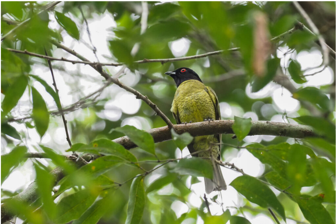
Black-headed Berryeater