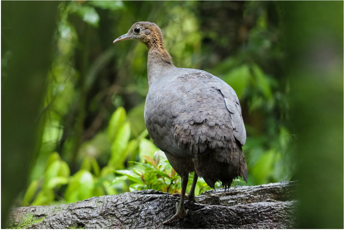
Solitary Tinamou