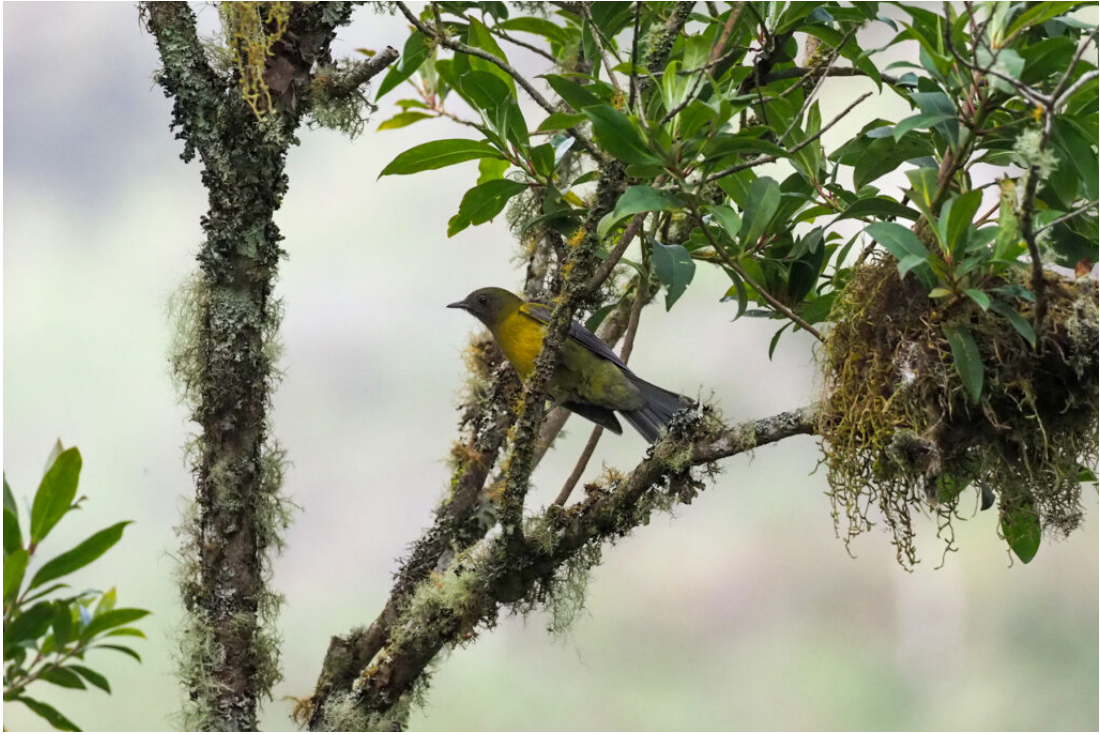
Grey-winged Cotinga