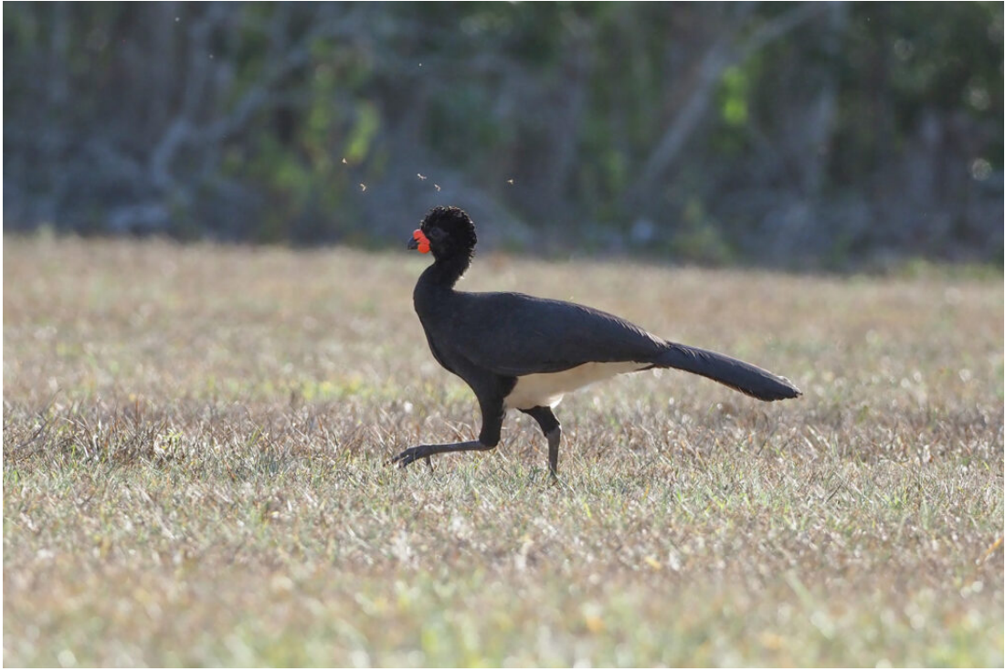
Red-billed Curassow