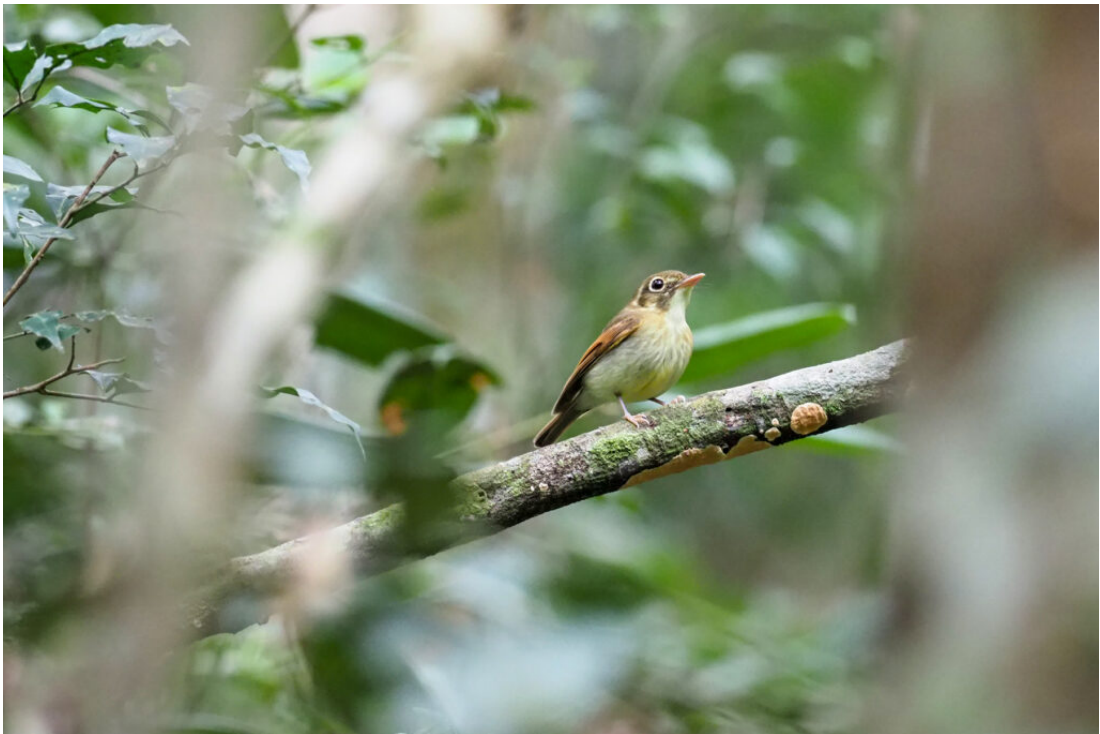
Russet-winged Spadebill