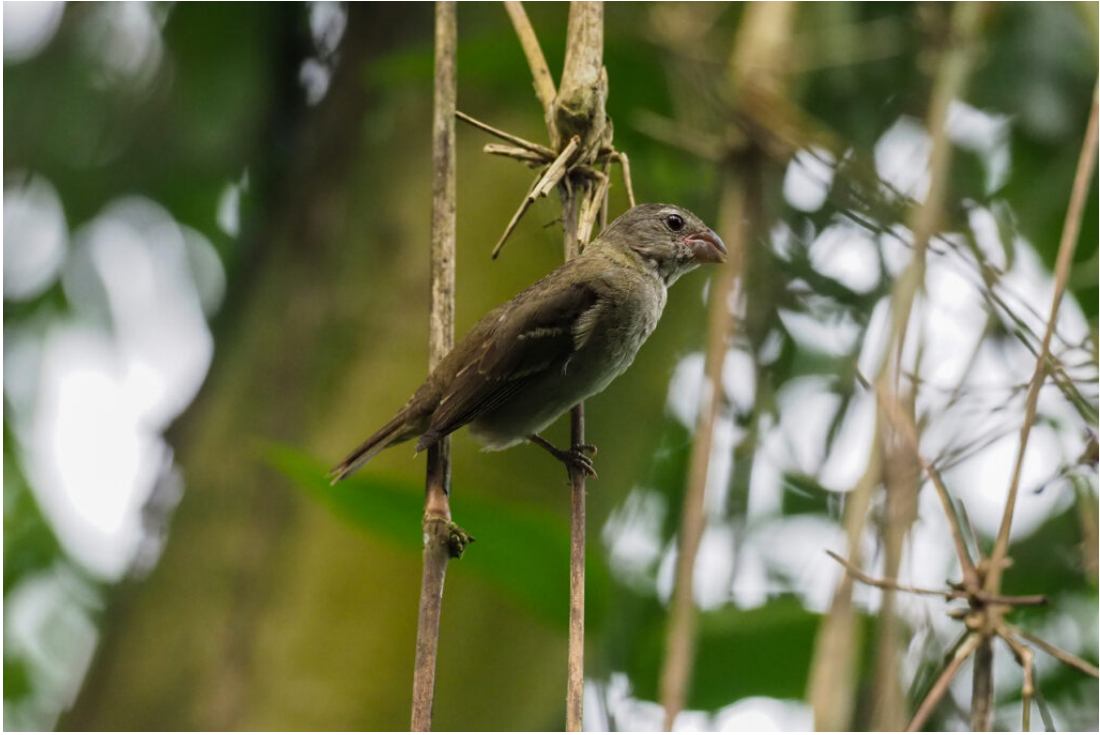
Buffy-fronted Seedeater