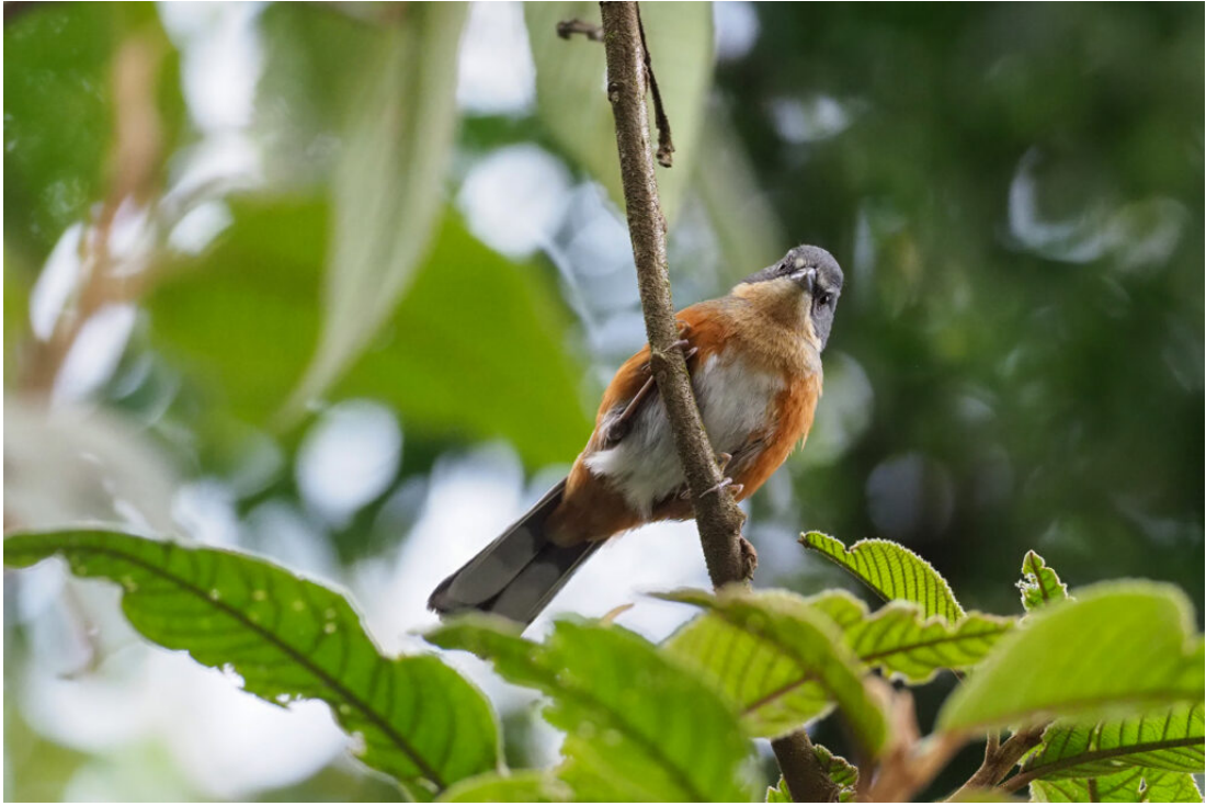
Buff-throated Warbling Finch