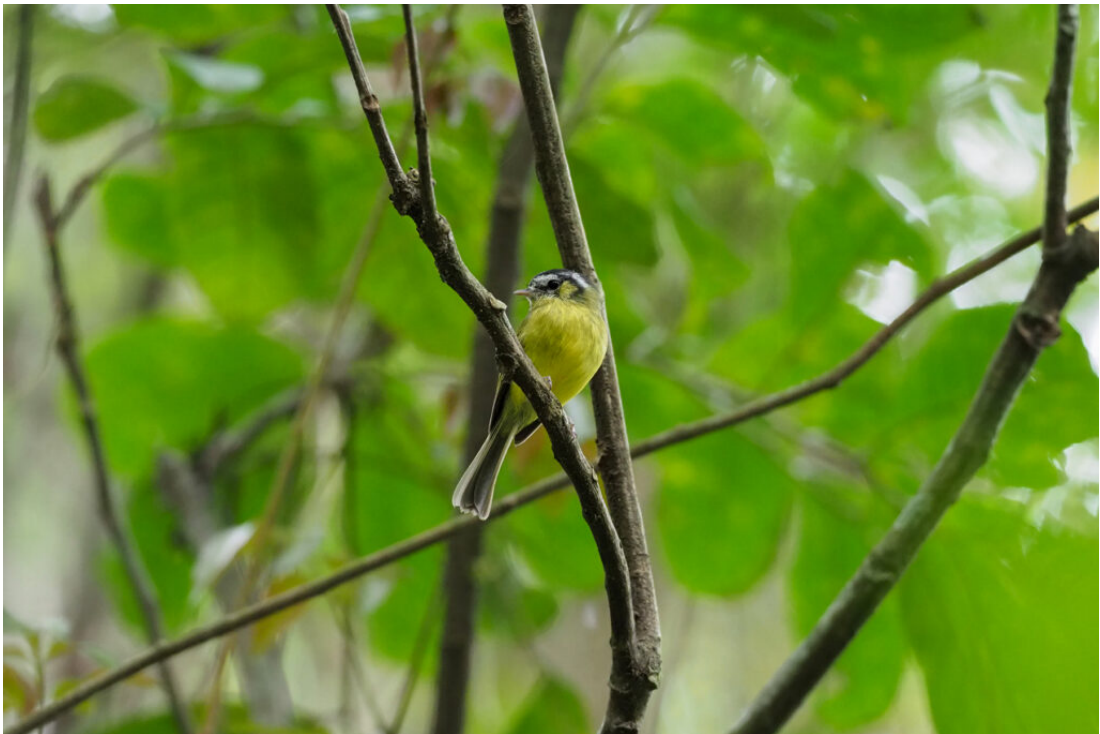
Southern Bristle Tyrant