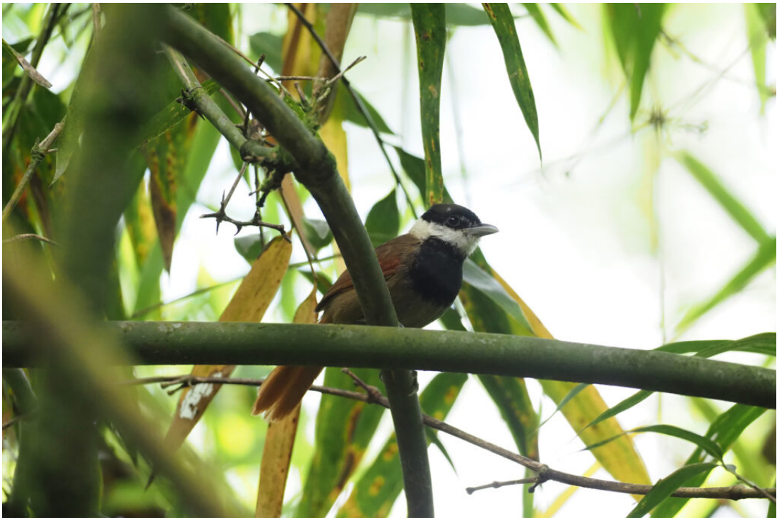
White-bearded Antshrike