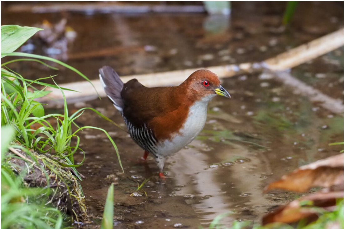
Red-and-white Crake