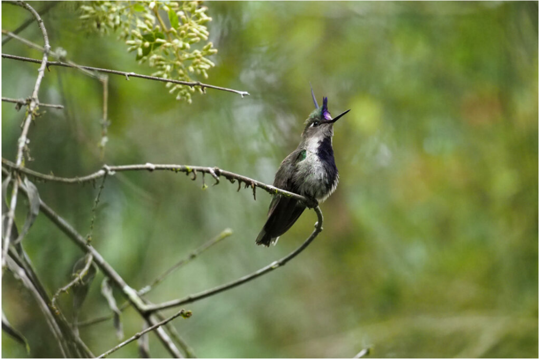
Purple-crowned Plovercrest