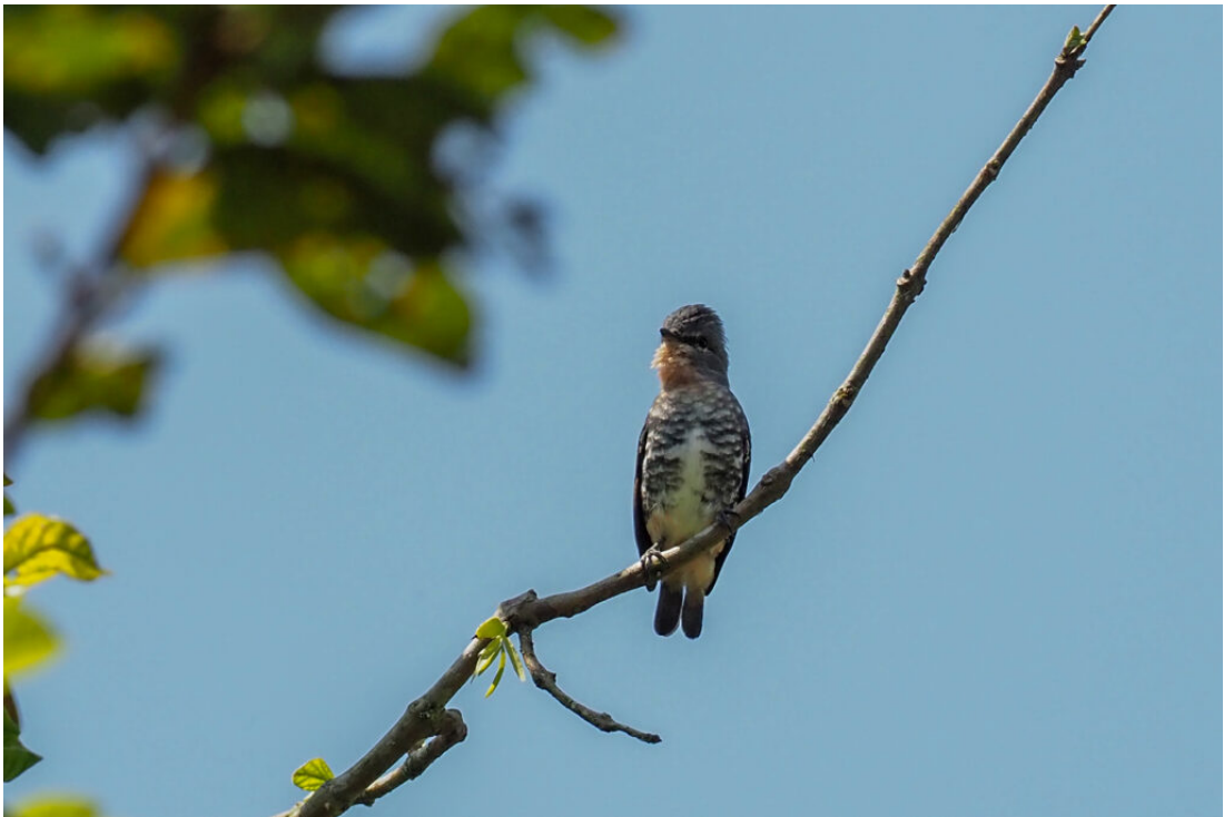
Buff-throated Purpletuft