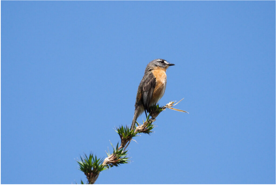
Grey-backed Tachuri