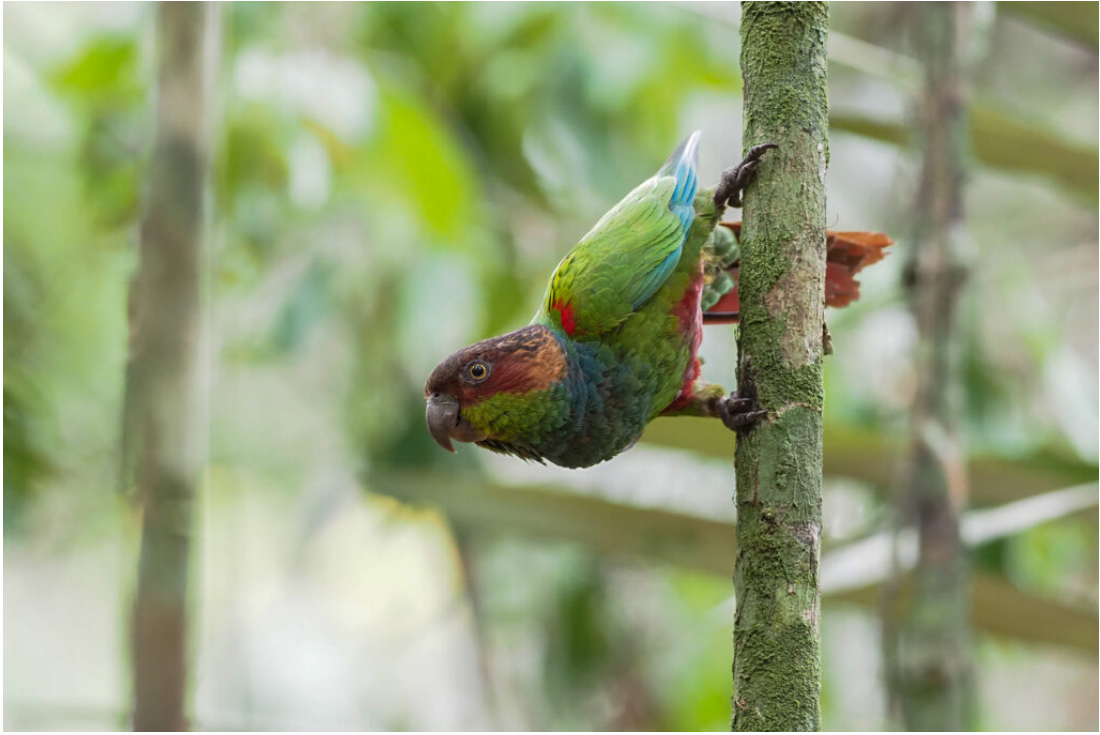
Ochre-marked Parakeet