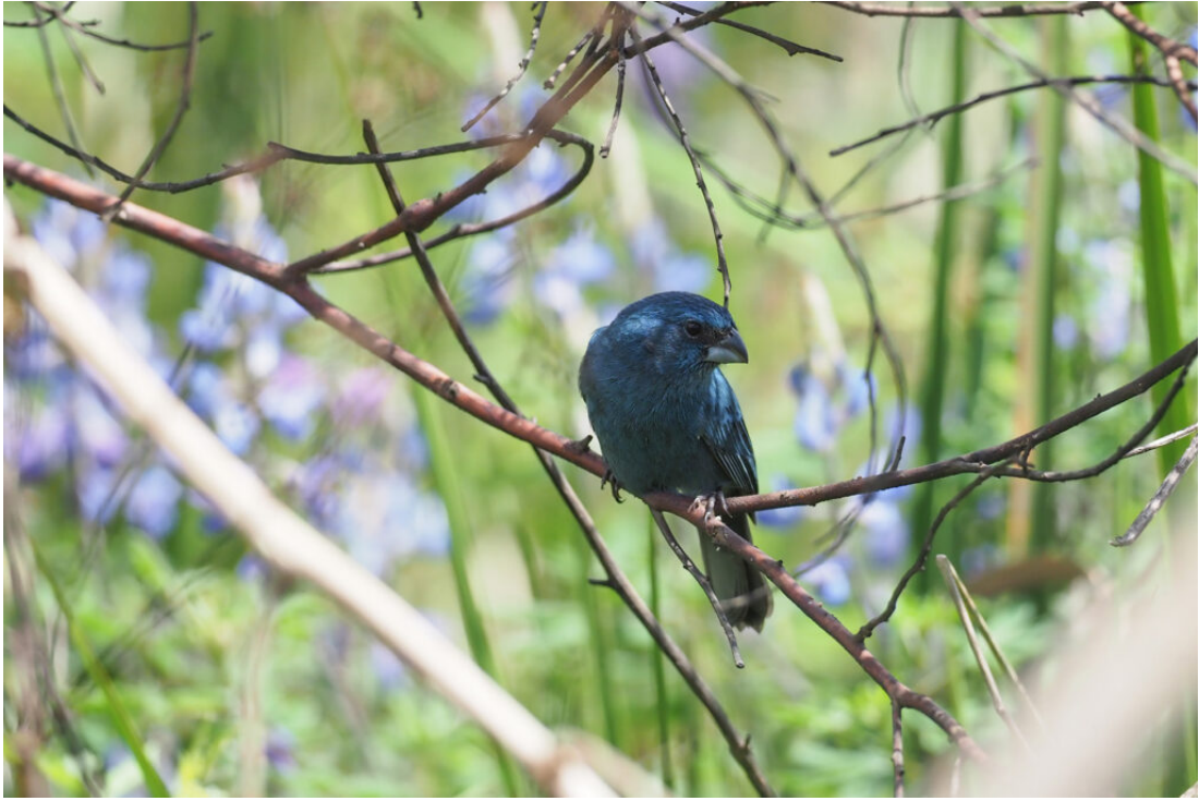
Glaucous-blue Grosbeak