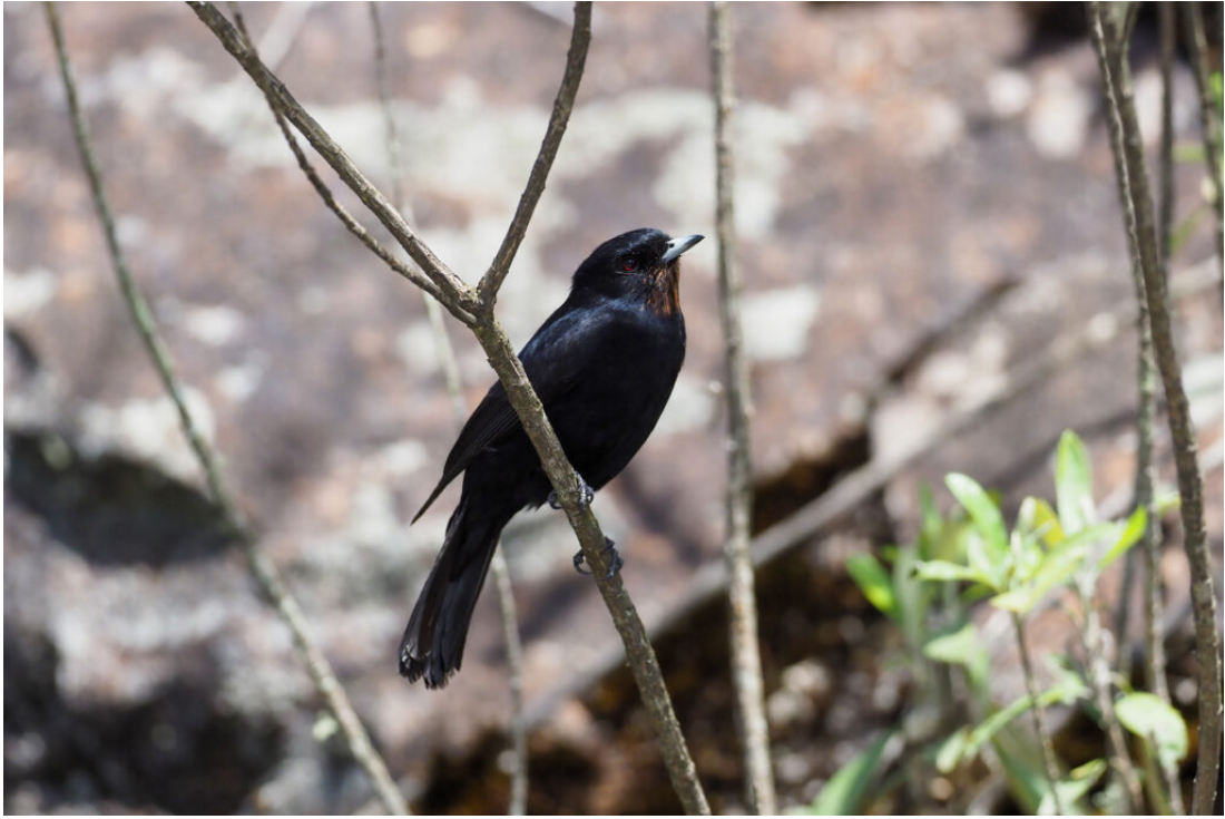
Velvety Black Tyrant