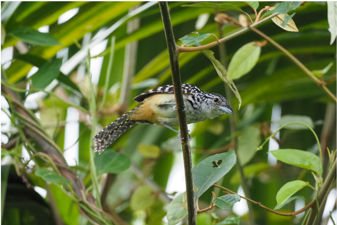
Spot-backed Antshrike (image by Eduardo Patrial)