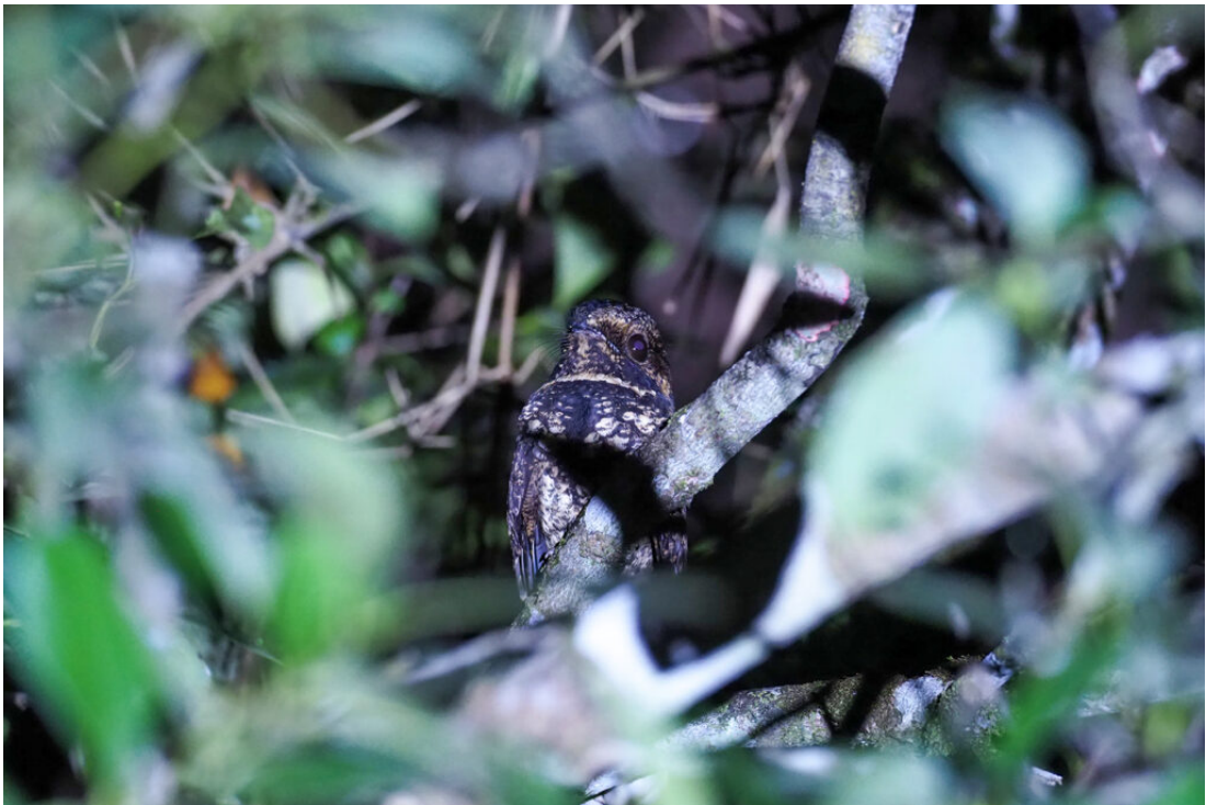
Silky-tailed Nighthjar (image by Eduardo Patrial)