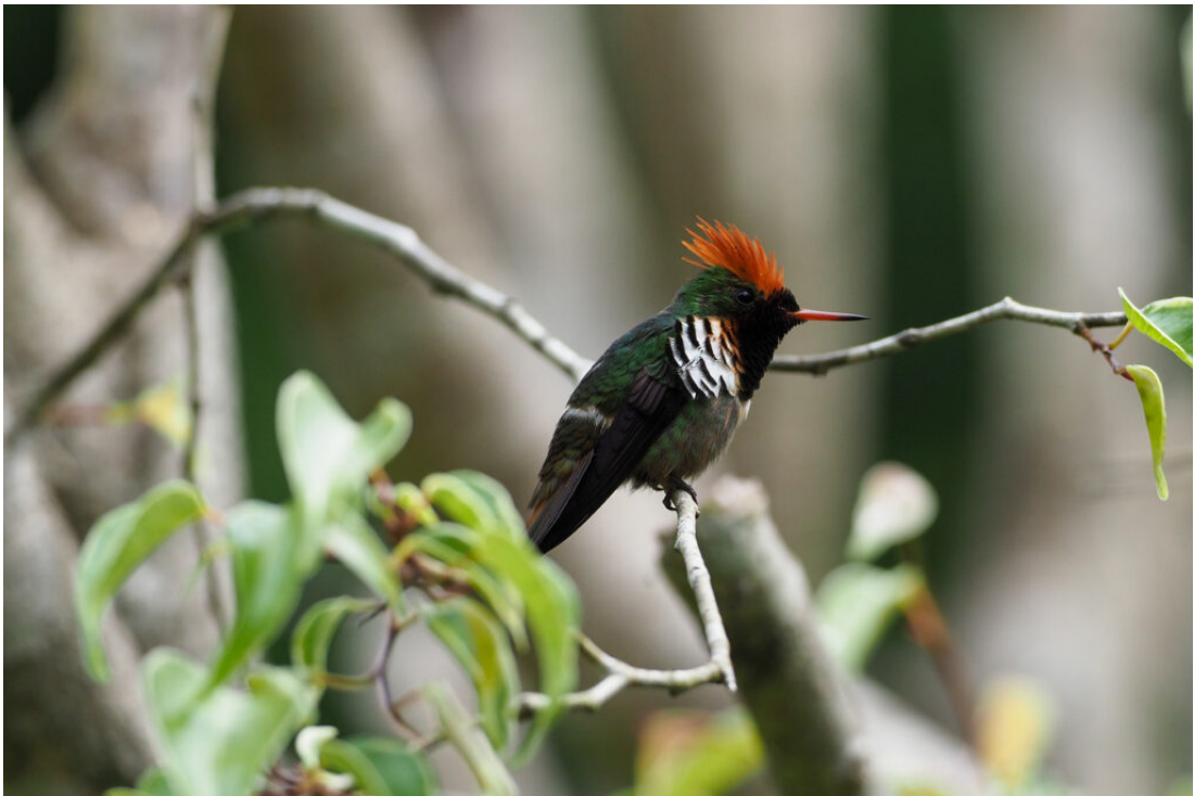
Frilled Coquette