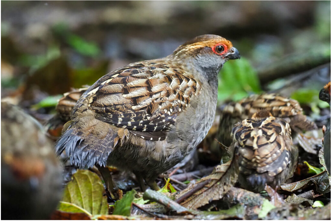
Spot-winged Wood Quail