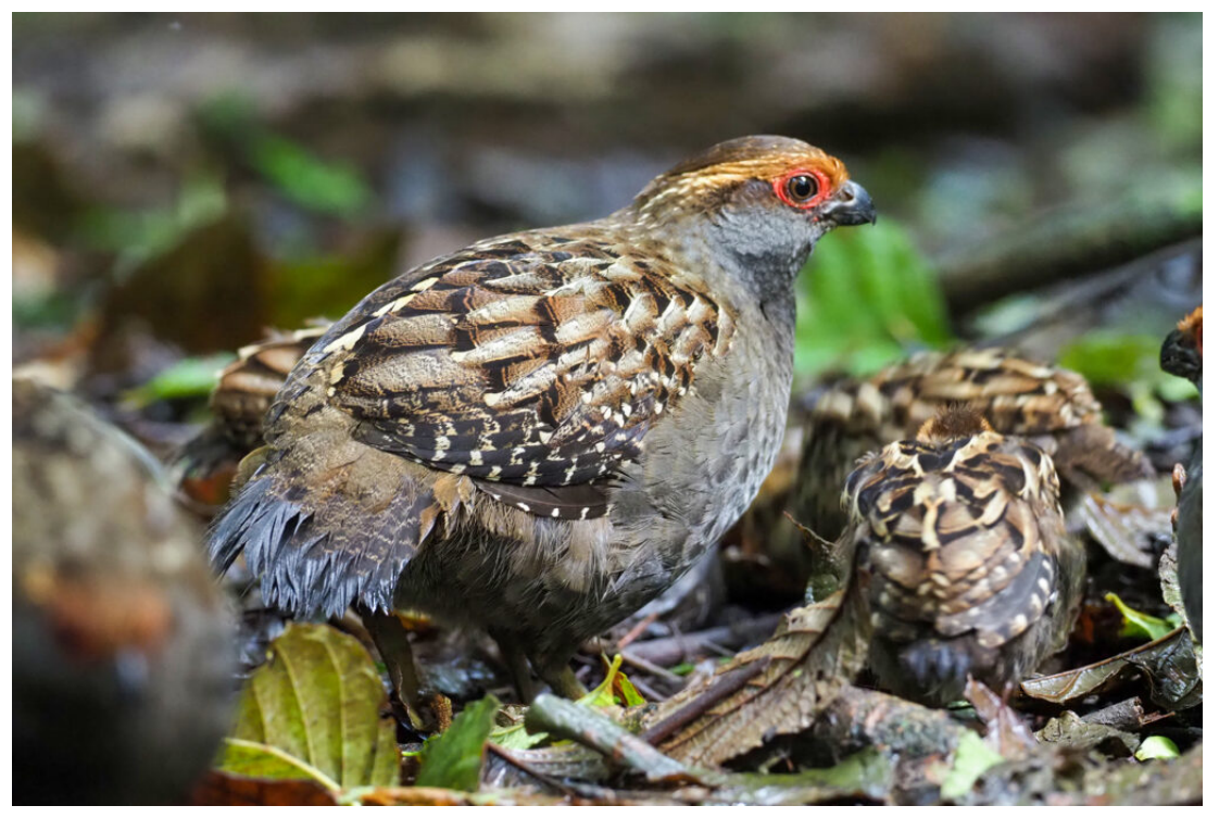
Spot-winged Wood Quail