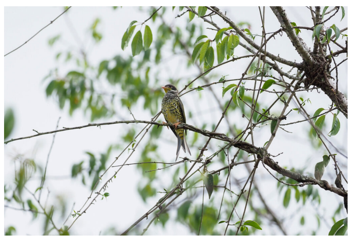
Swallow-tailed Cotinga