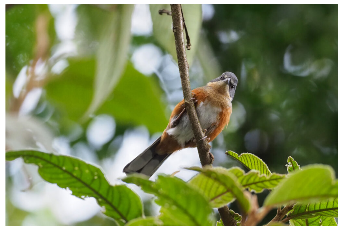
Buff-throated Warbling Finch