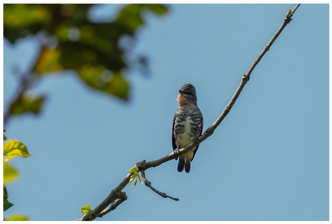
Buff-throated Purpletuft