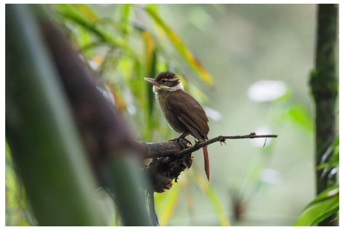
White-collared Foliage-gleaner