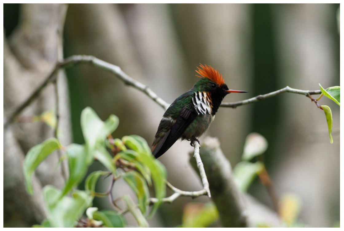
Frilled Coquette