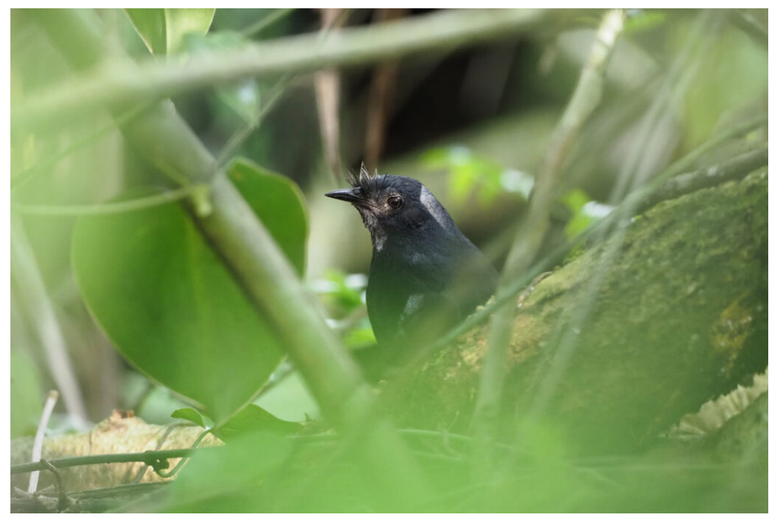
Slaty Bristlefront