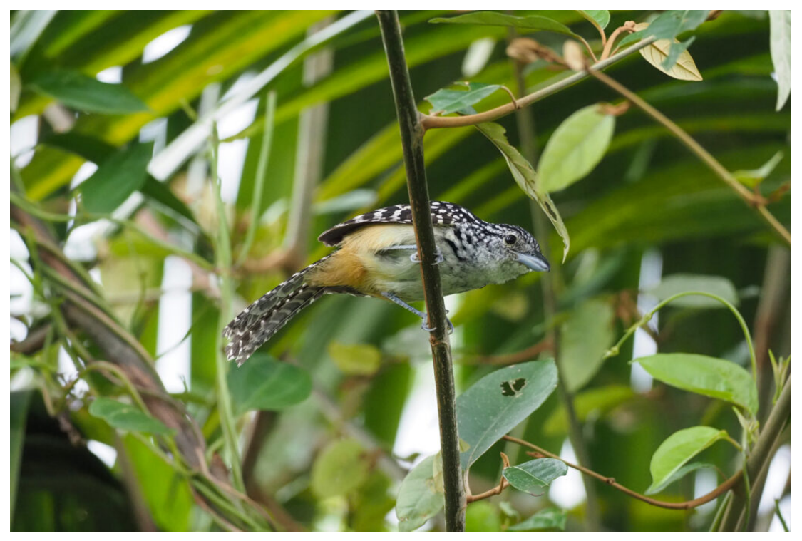
Spot-backed Antshrike