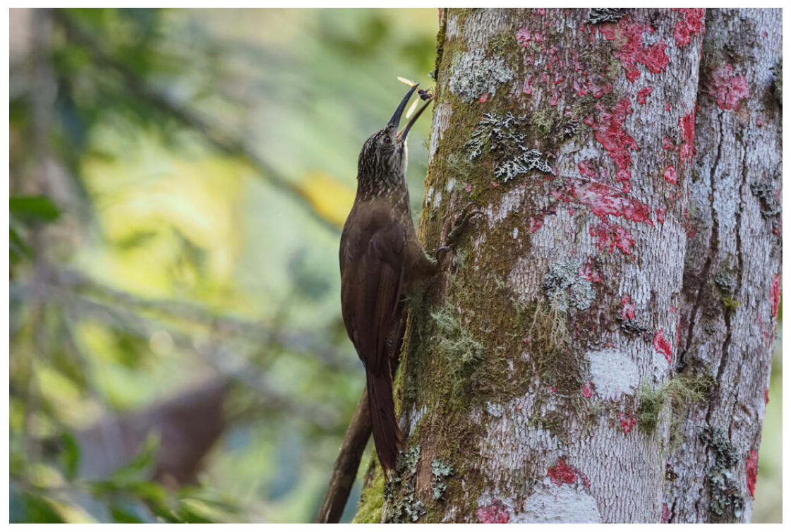
White-throated Woodcreeper