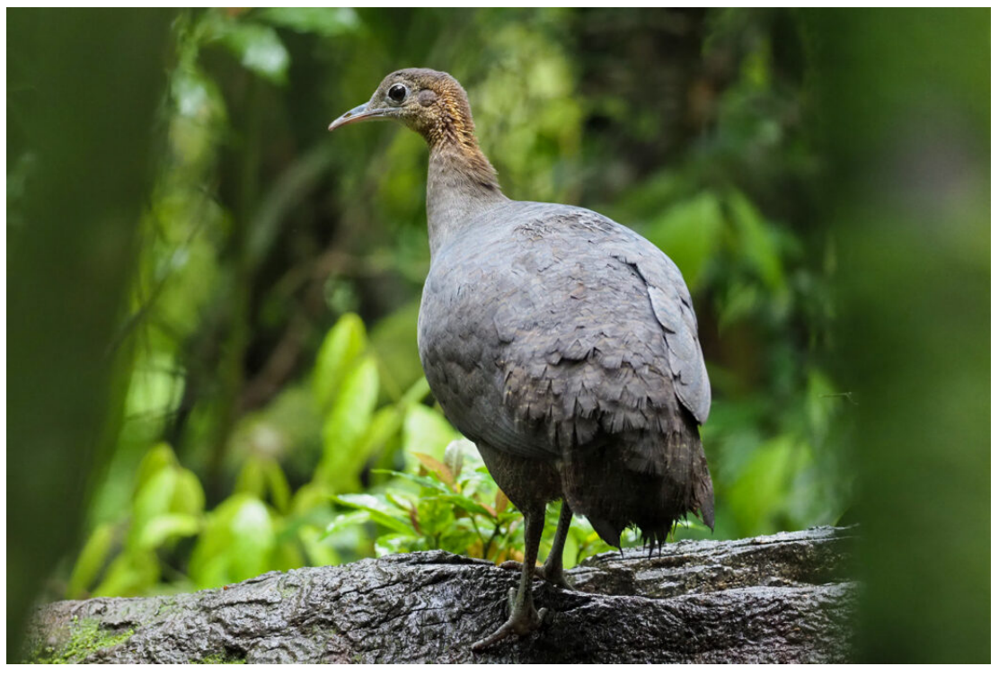
Solitary Tinamou