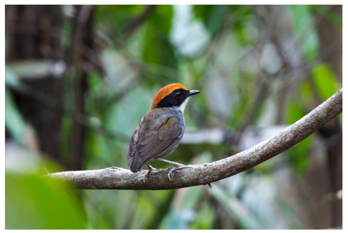
Black-cheeked Gnatear