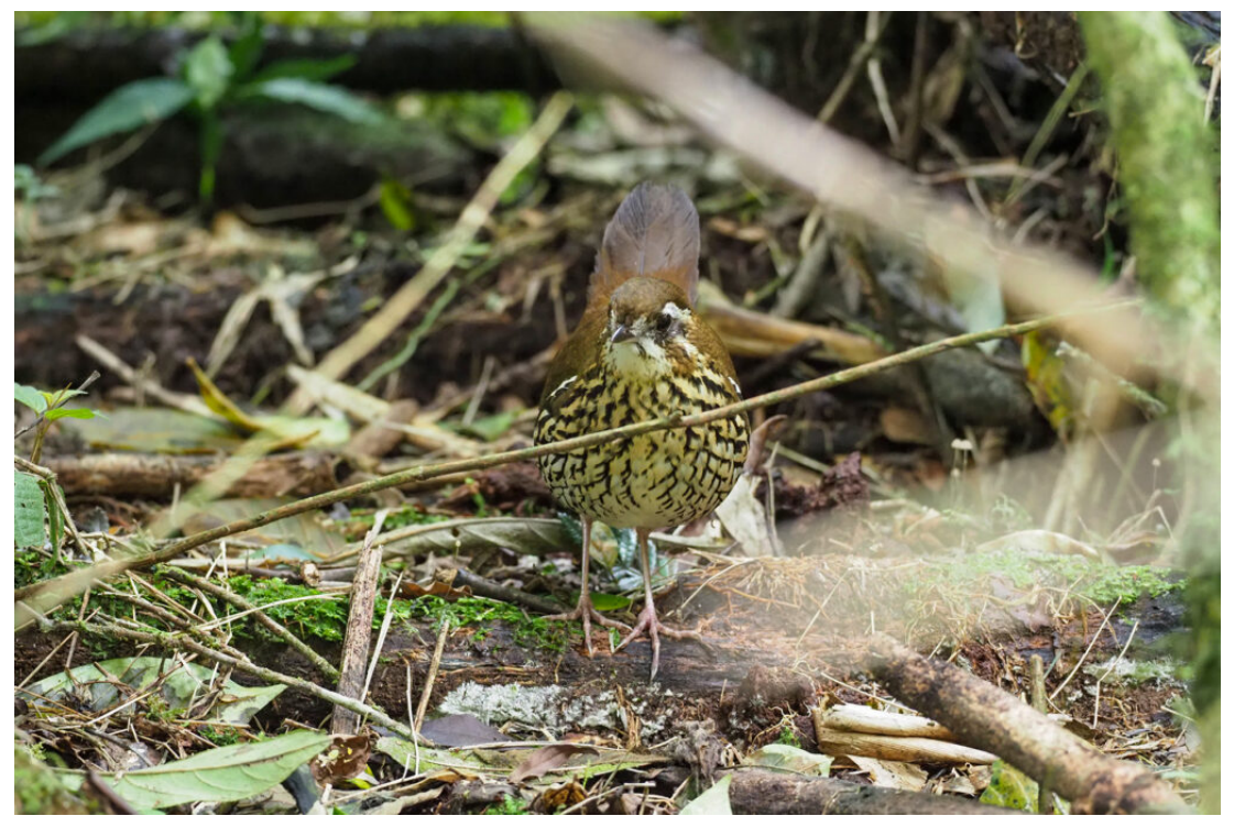
Rufous-tailed Antthrush