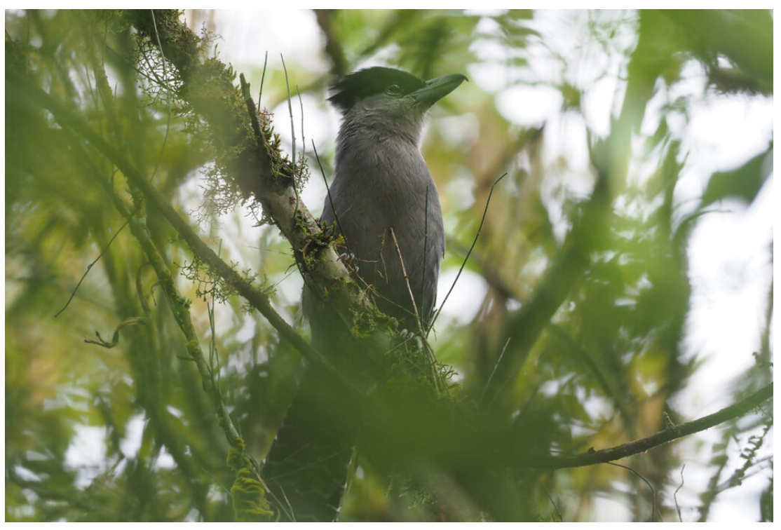
Giant Antshrike