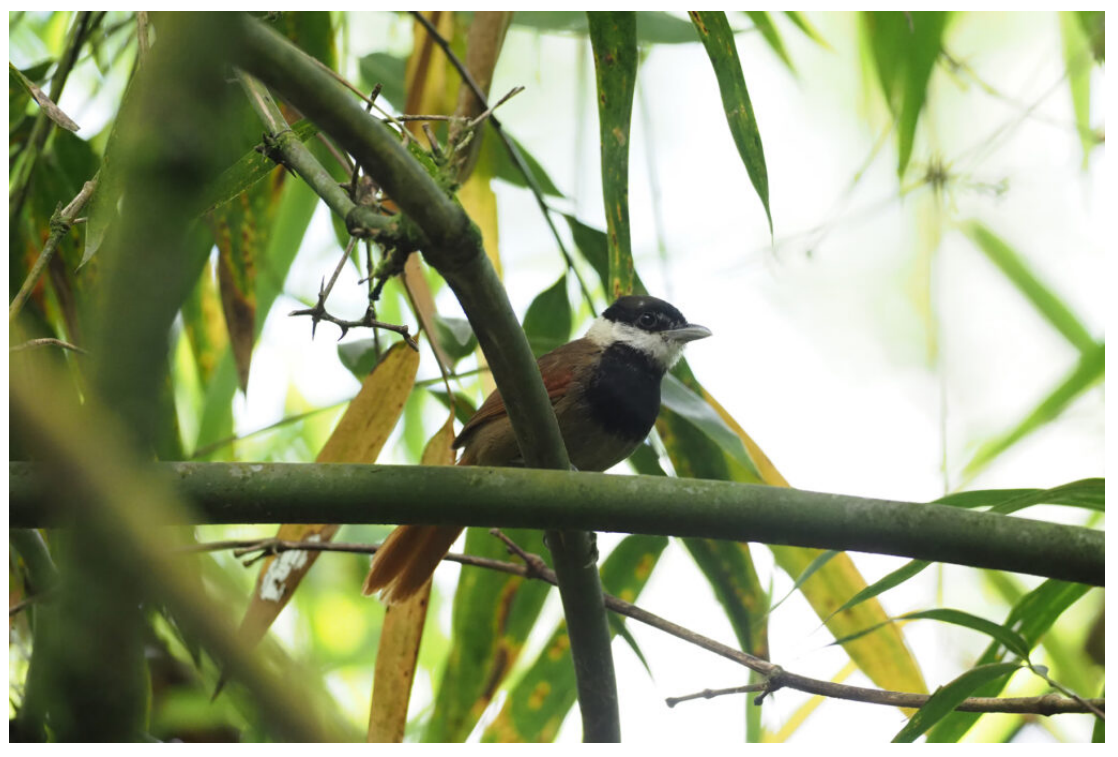
White-bearded Antshrike