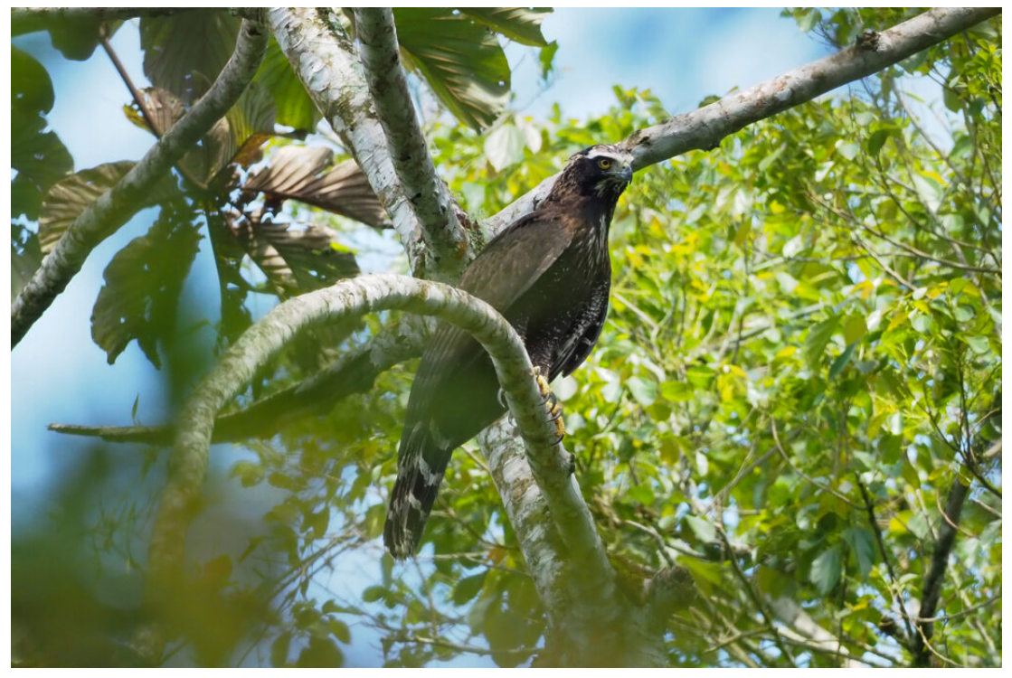
Black Hawk-Eagle