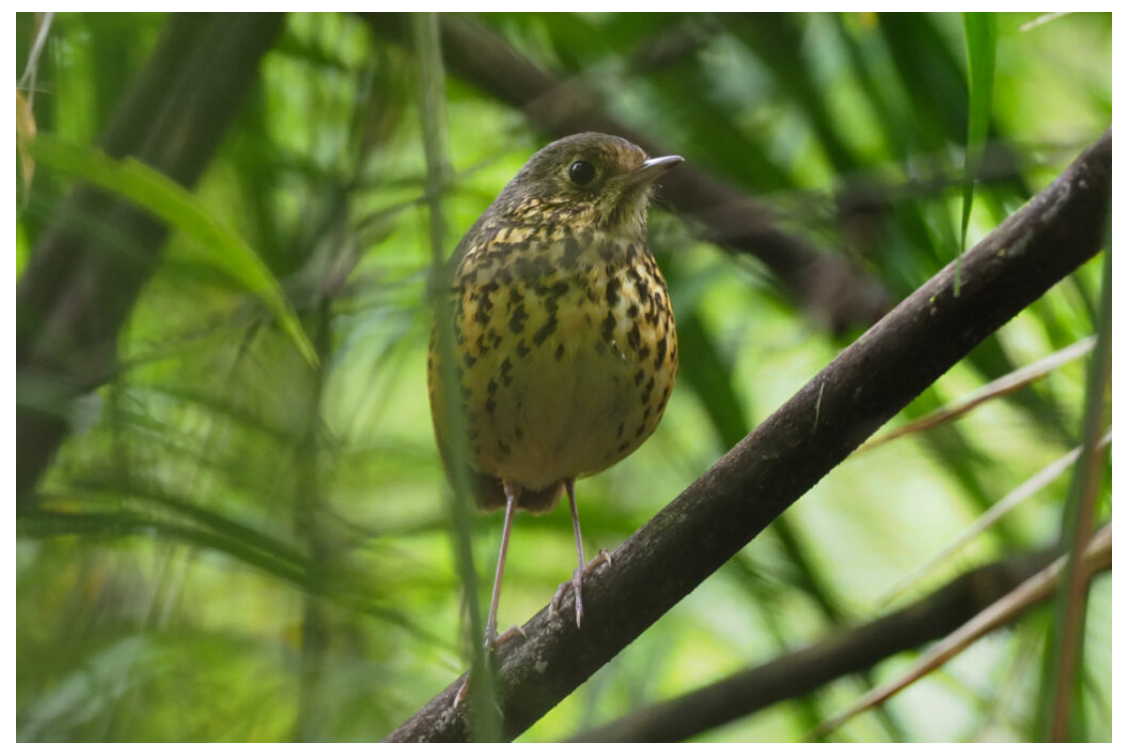
Speckle-breasted Antpitta