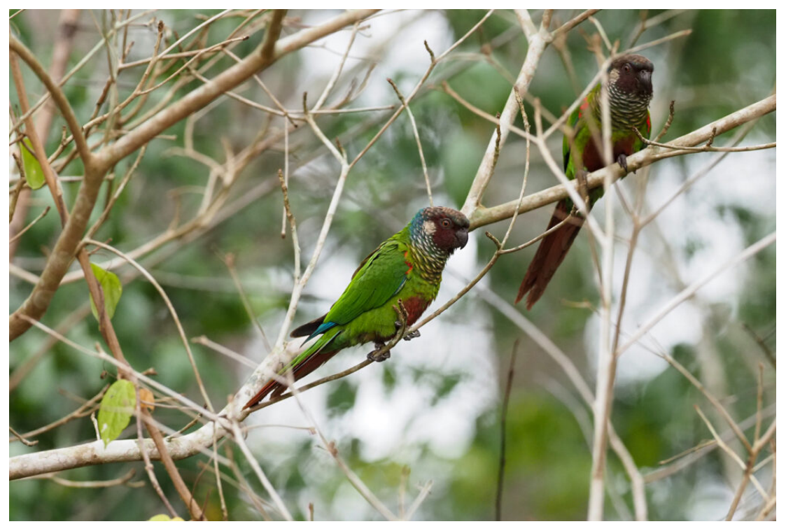
White-eared Parakeet