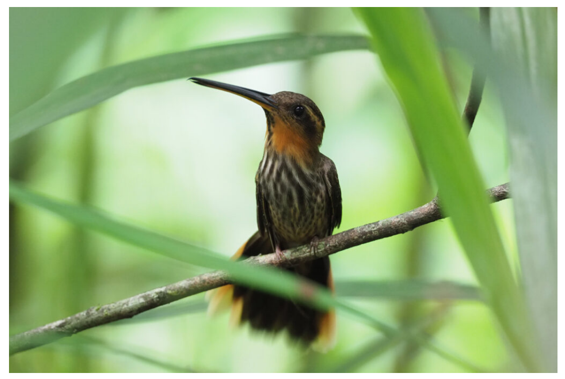
Saw-billed Hermit