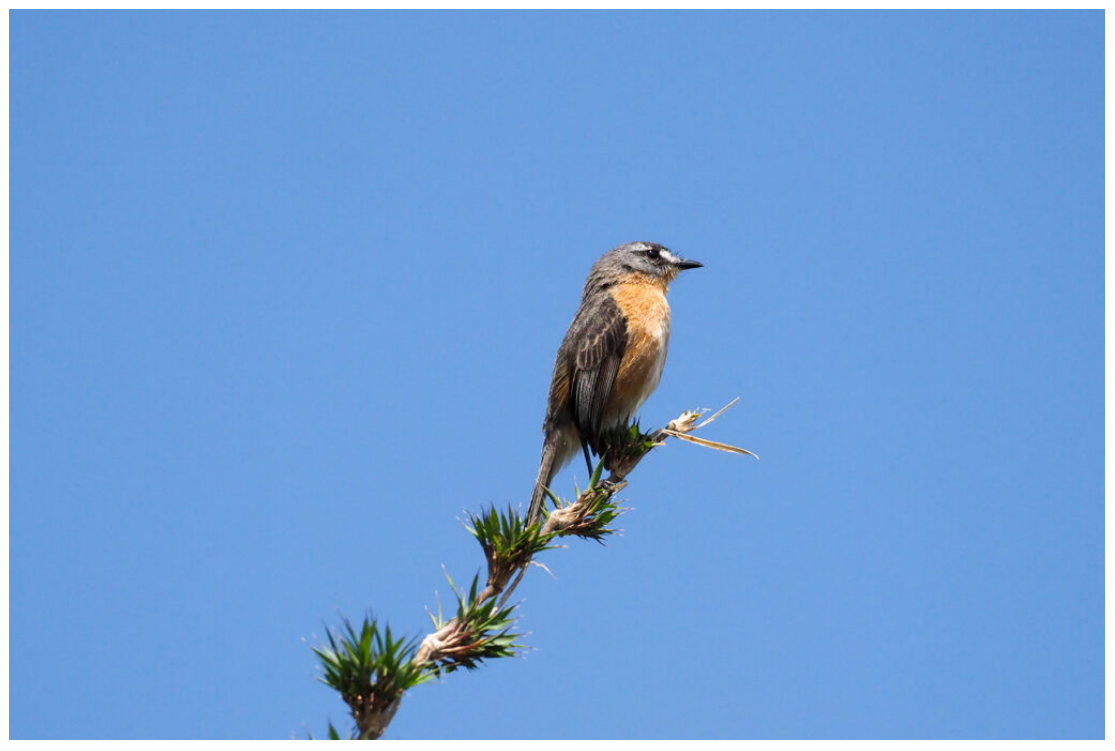
Grey-backed Tachuri