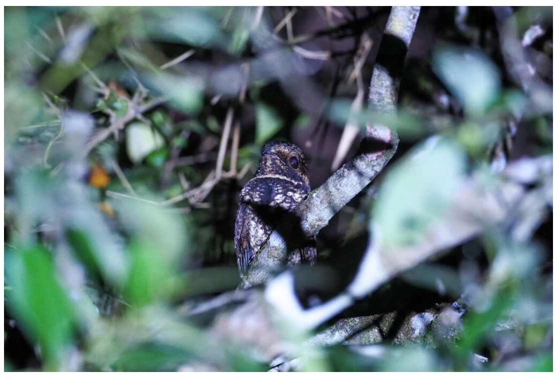
Silky-tailed Nightjar