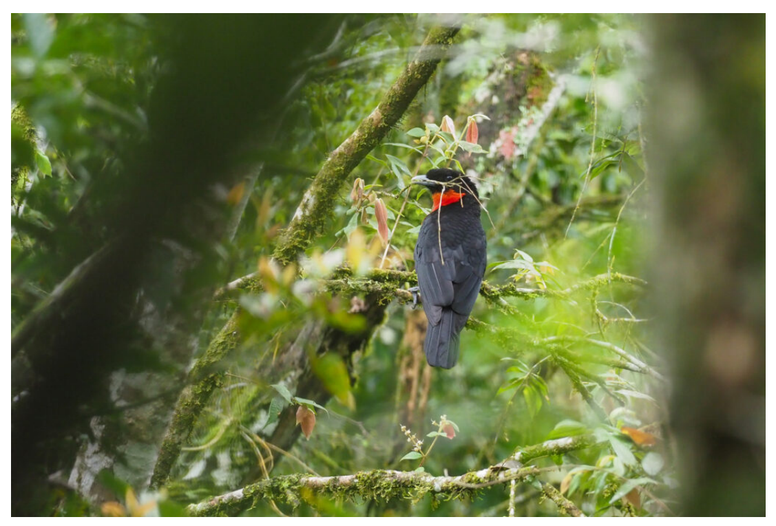
Red-ruffed Fruitcrow