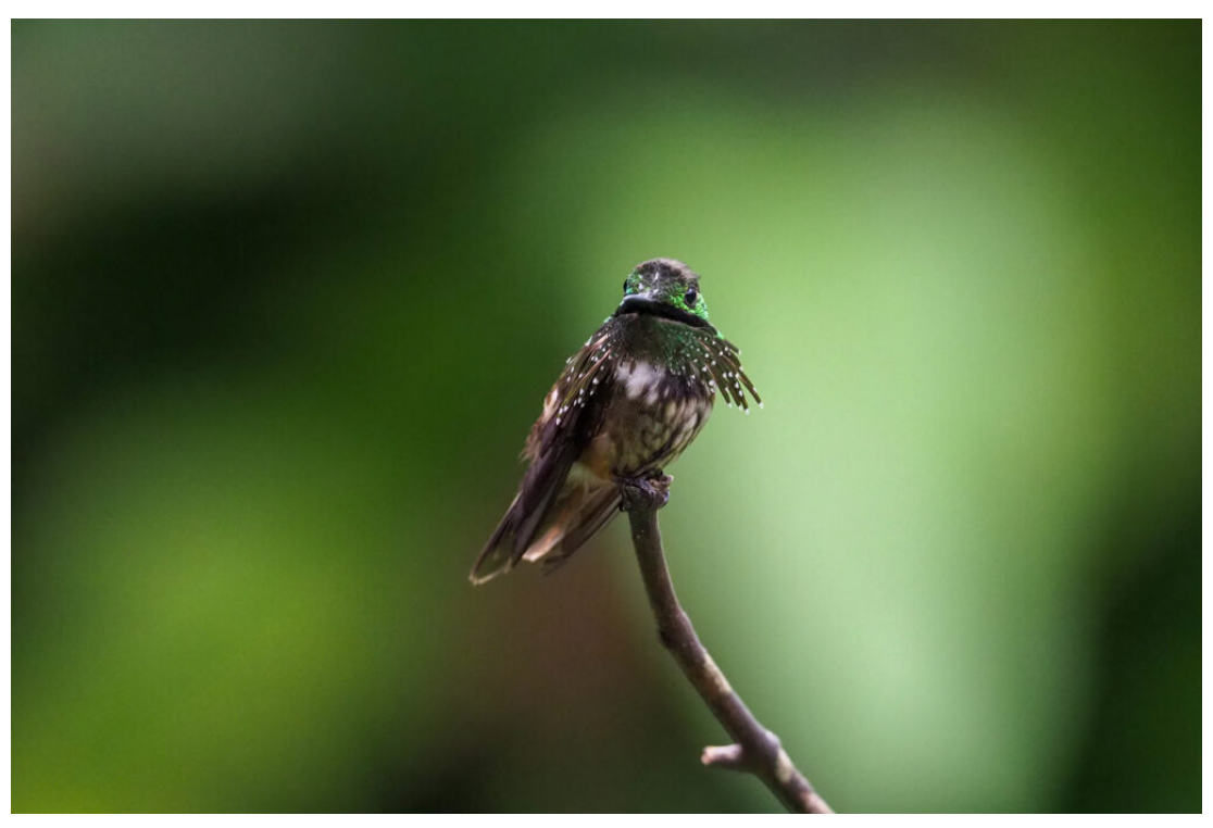
Festive Coquette