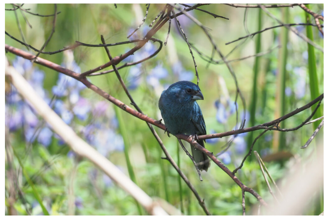
Glaucous-blue Grosbeak