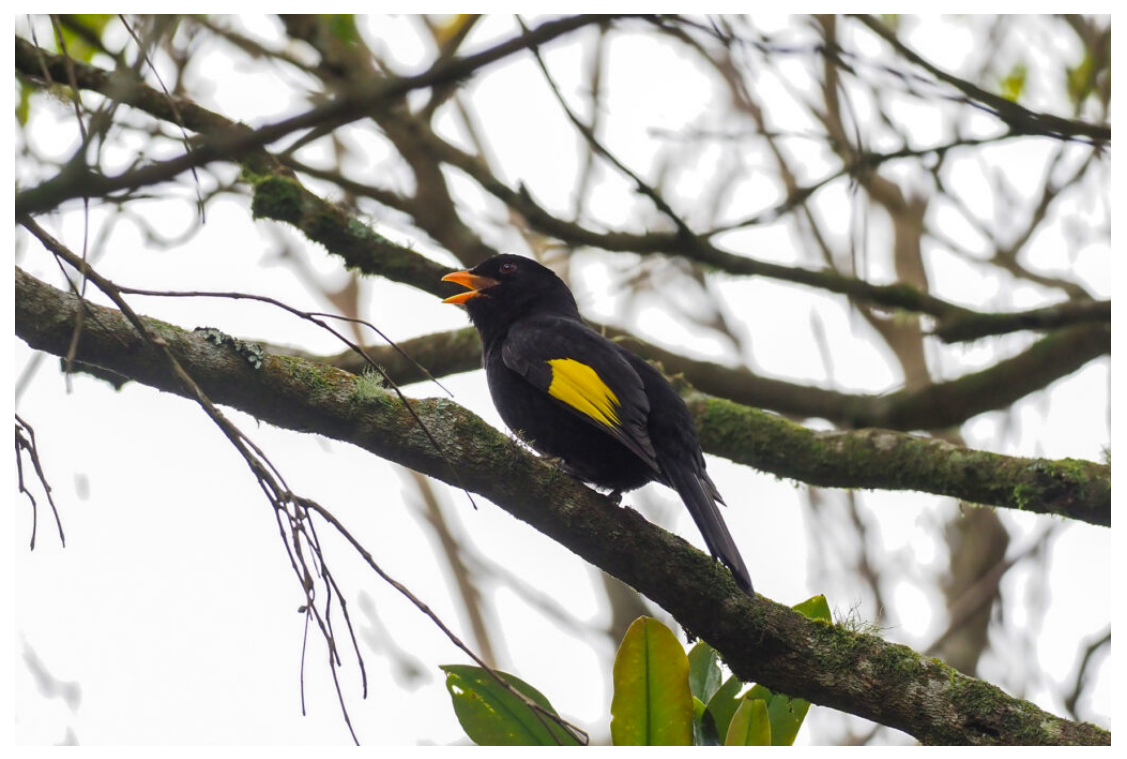
Black-and-gold Cotinga