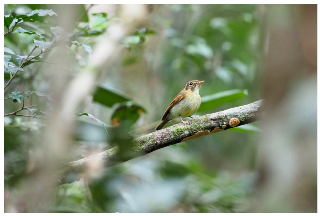
Russet-winged Spadebill