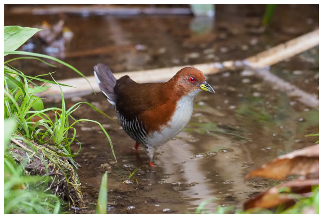
Red-and-white Crake