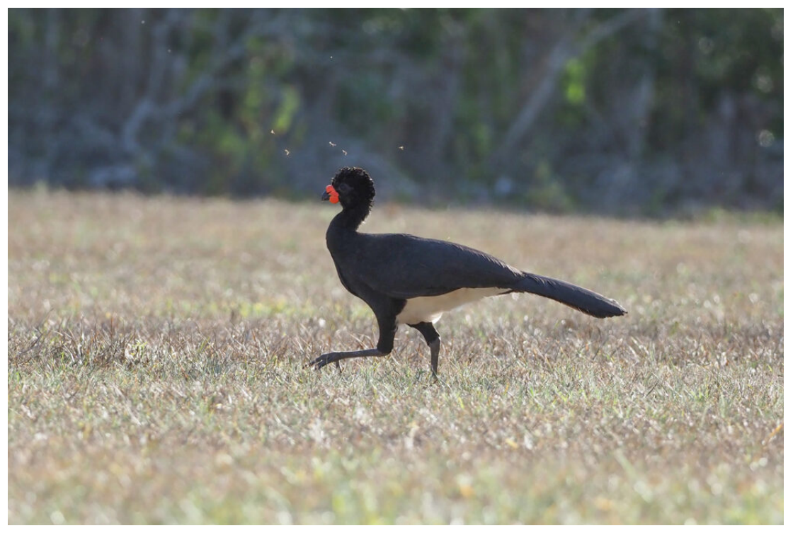
Red-billed Curassow