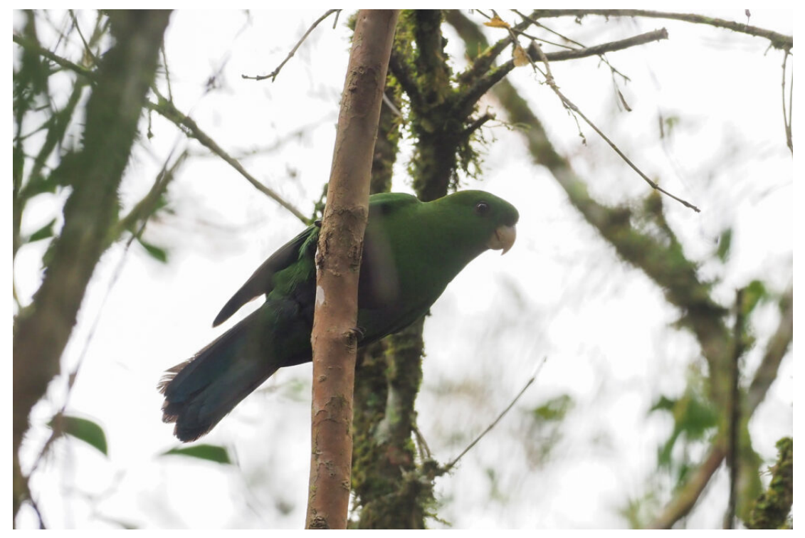
Blue-bellied Parrot