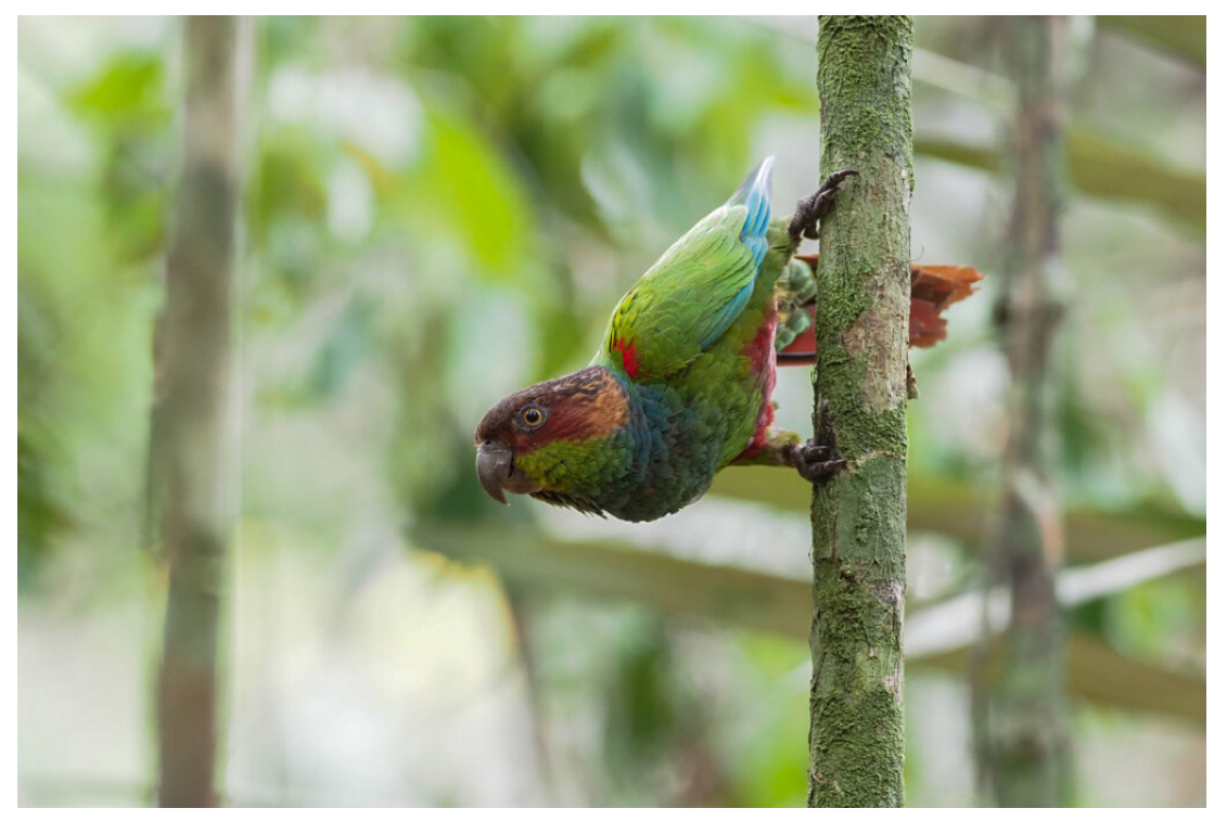
Ochre-marked Parakeet