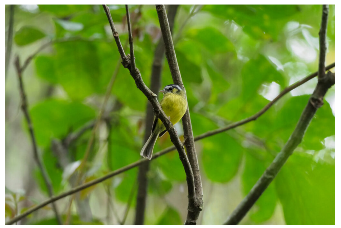
Southern Bristle Tyrant