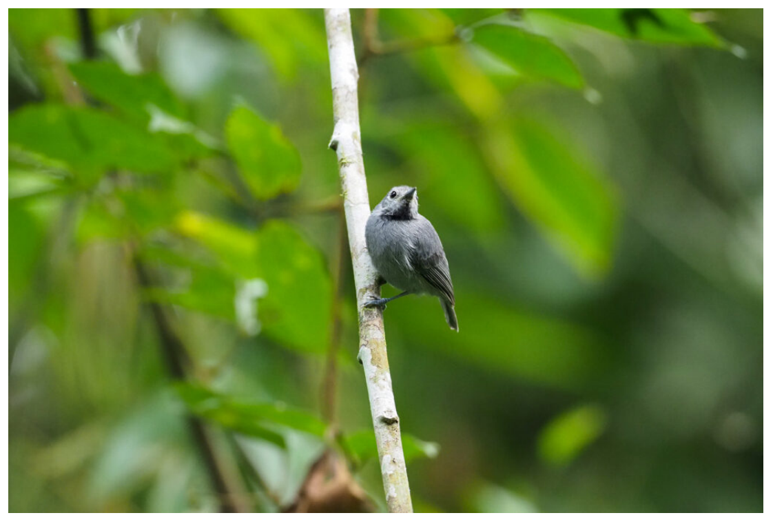
Unicoloured Antwren