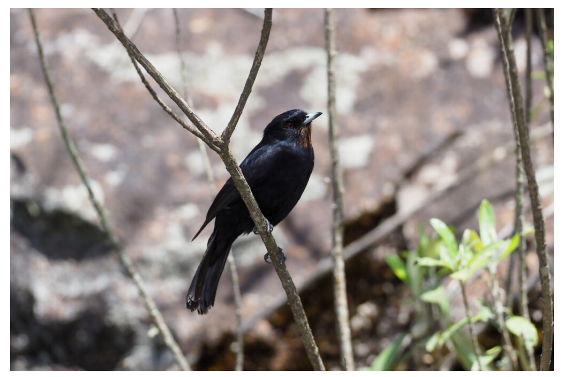
Velvety Black Tyrant