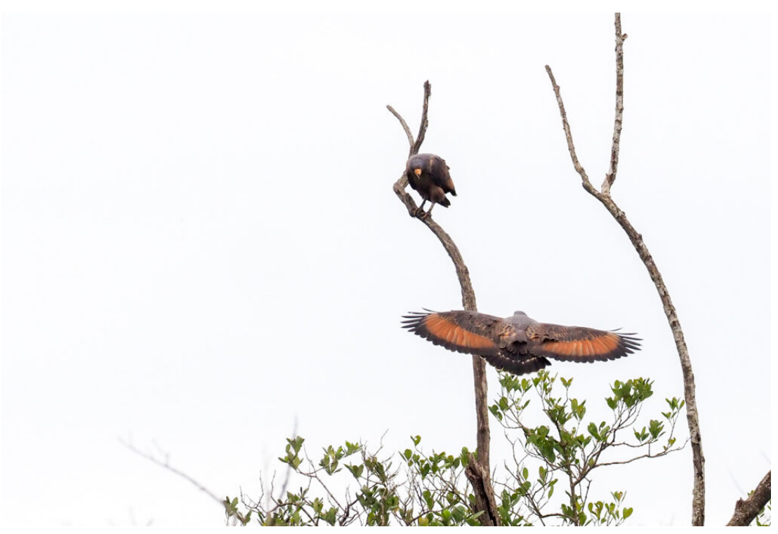
Rufous Crab Hawk