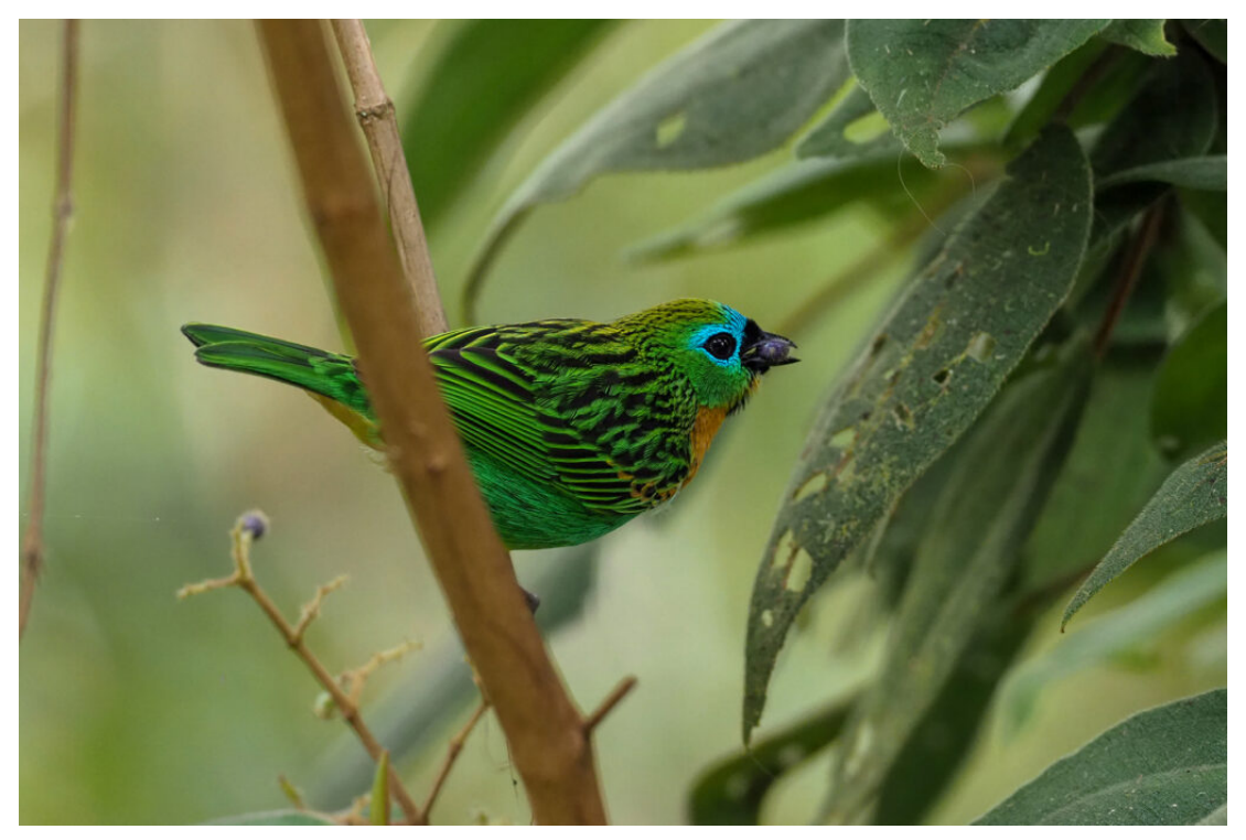
Brassy-breasted Tanager