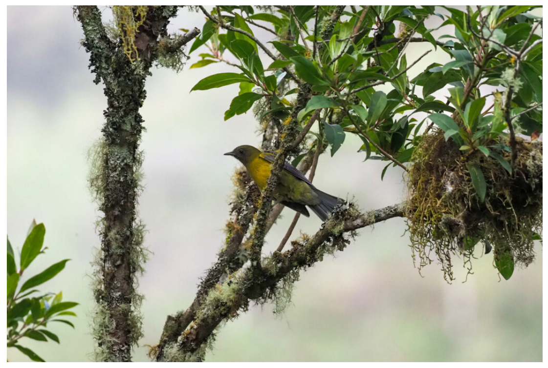
Grey-winged Cotinga