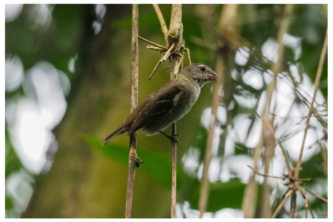
Buffy-fronted Seedeater