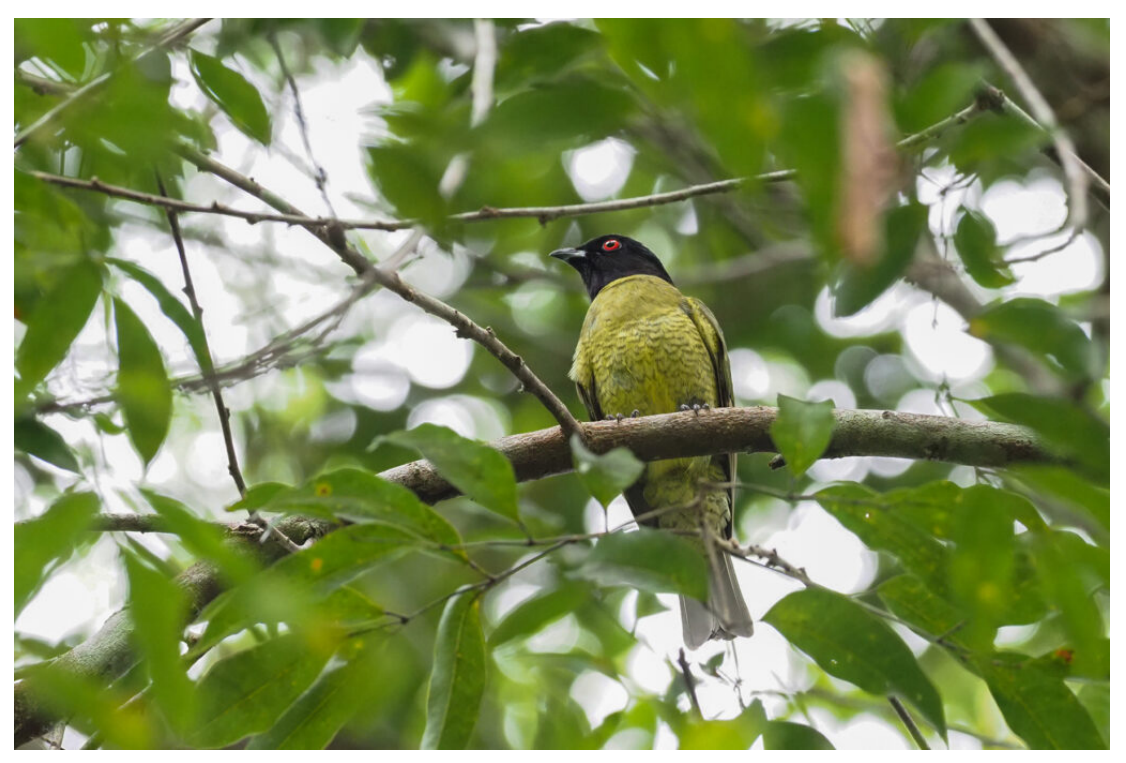
Black-headed Berryeater