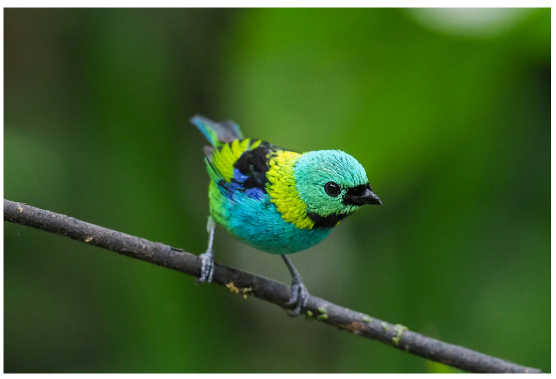
Green-headed Tanager