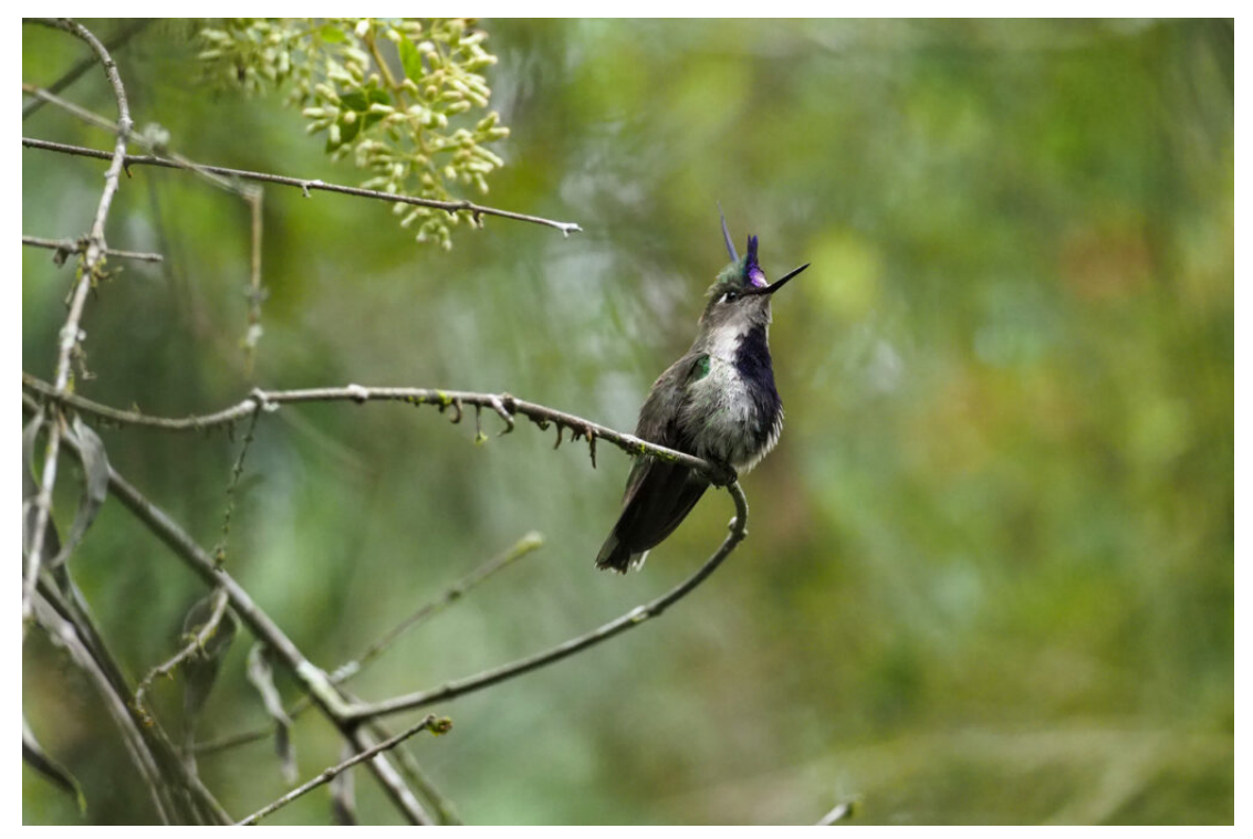
Purple-crowned Plovercrest