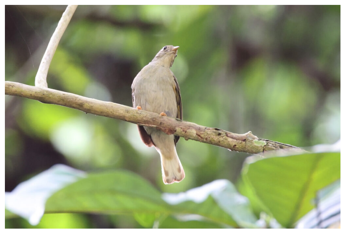
Yellow-footed Honeyguide