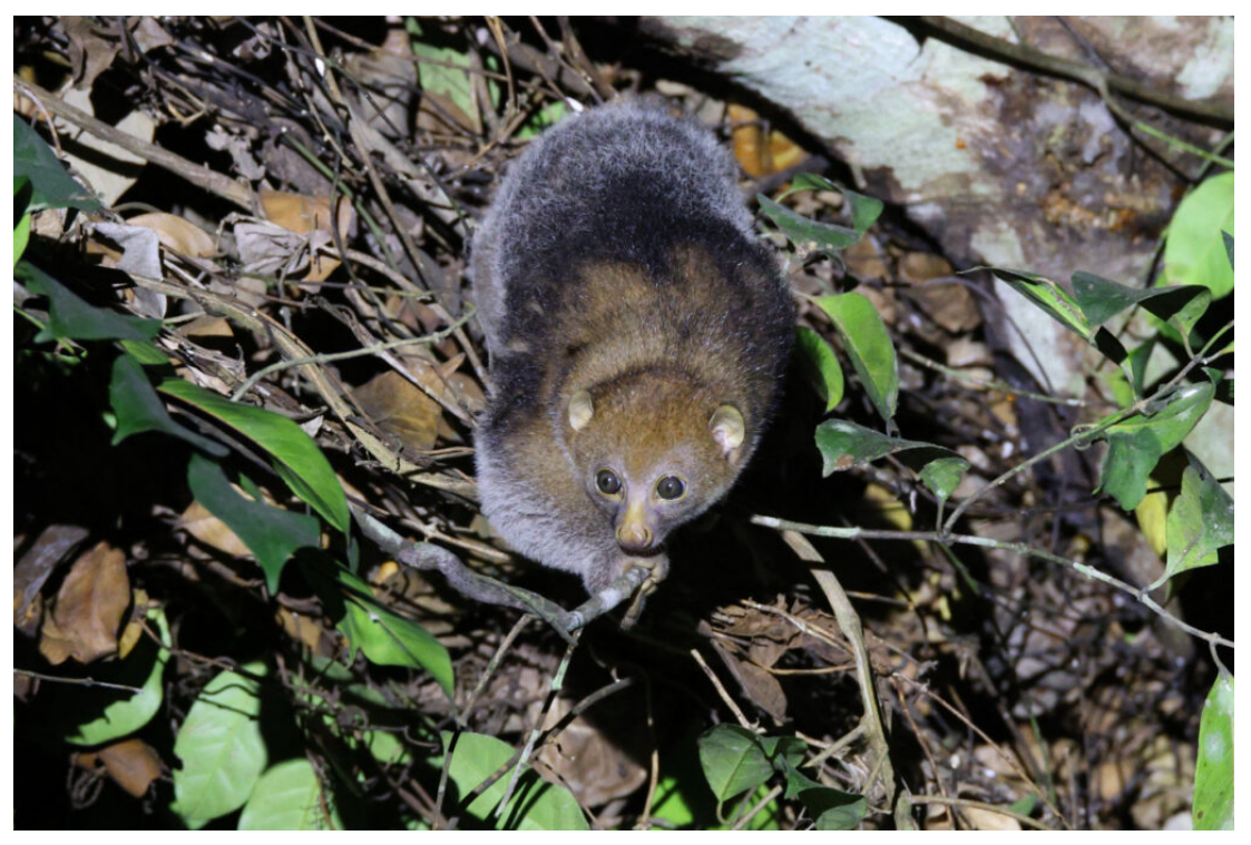
West African Potto