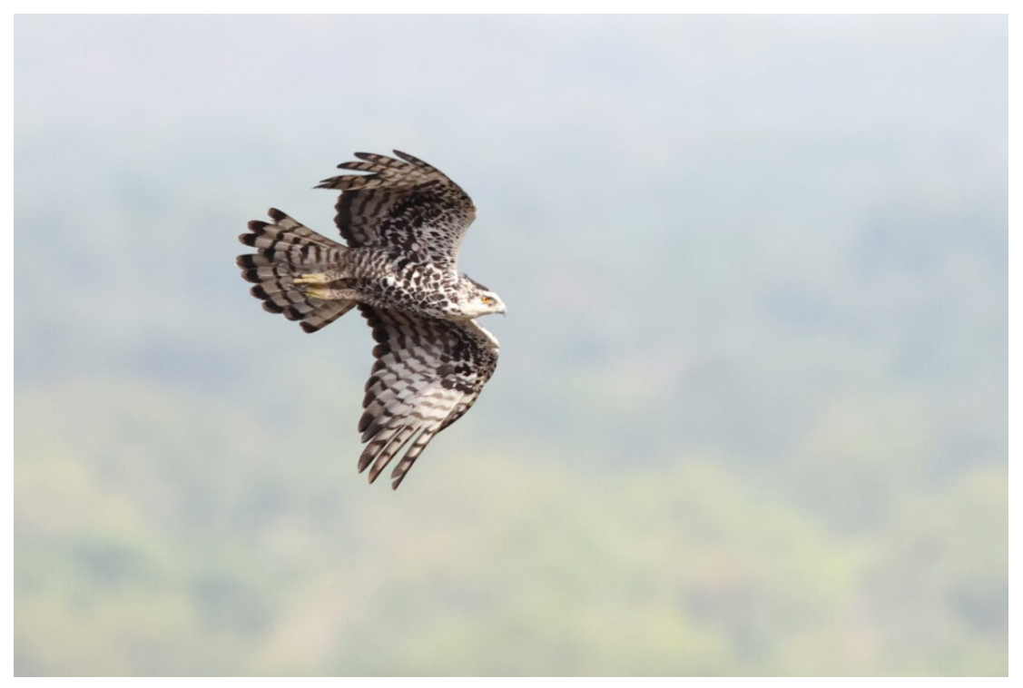
Ayre's Hawk-Eagle