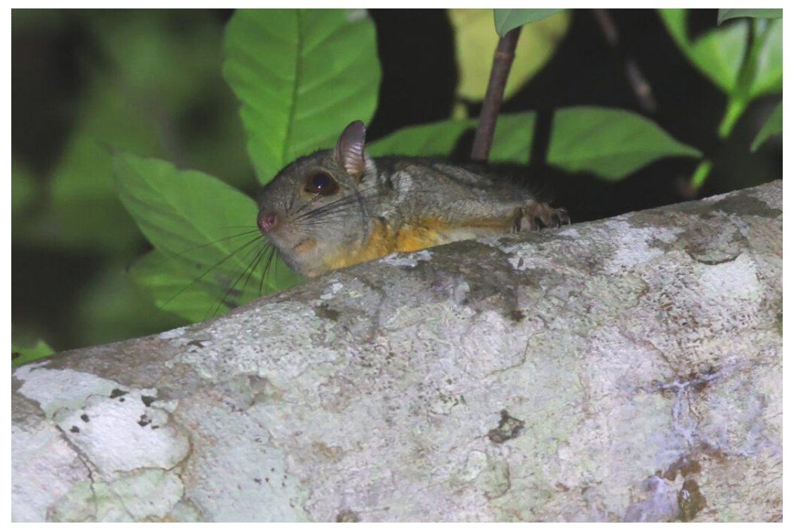
Beecroft's Anomalure