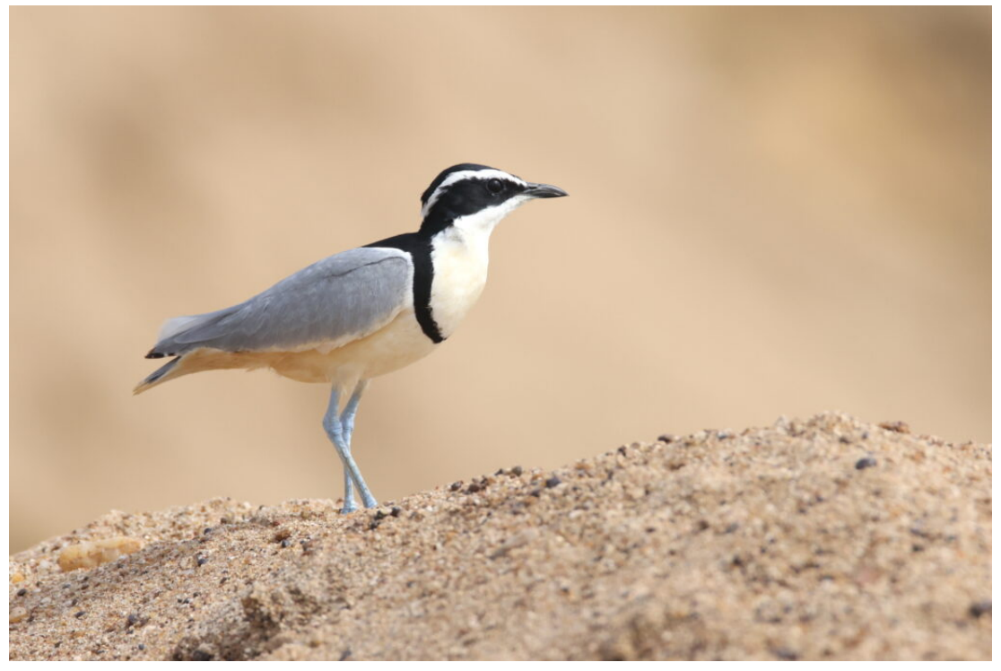
Egyptian Plover