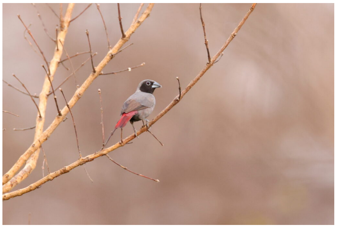
Black-faced Firefinch