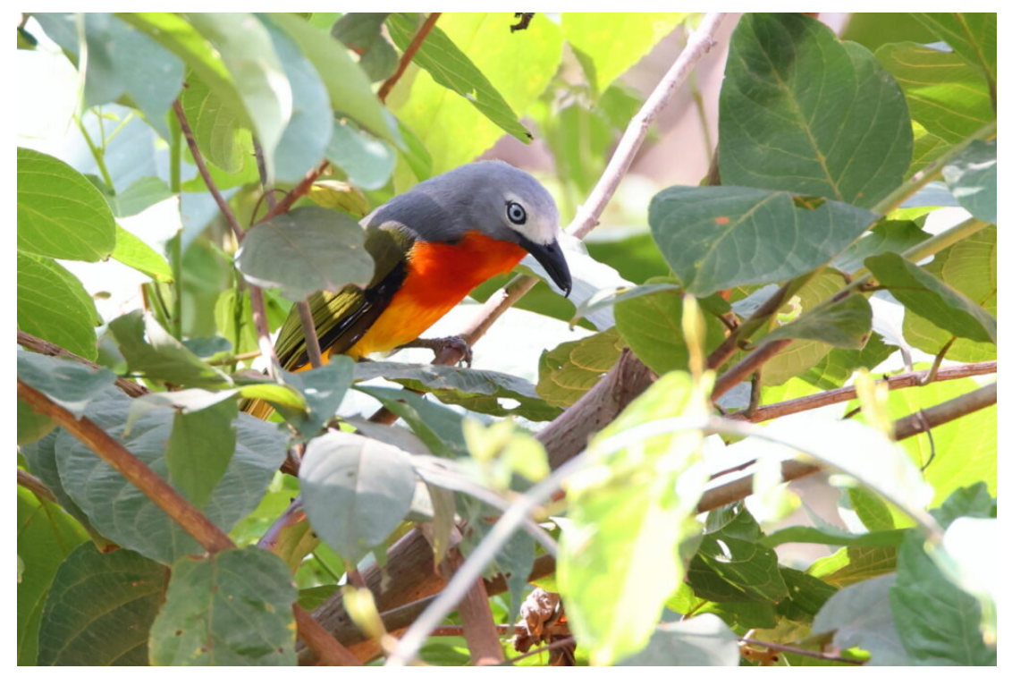
Fiery-breasted Bushshrike