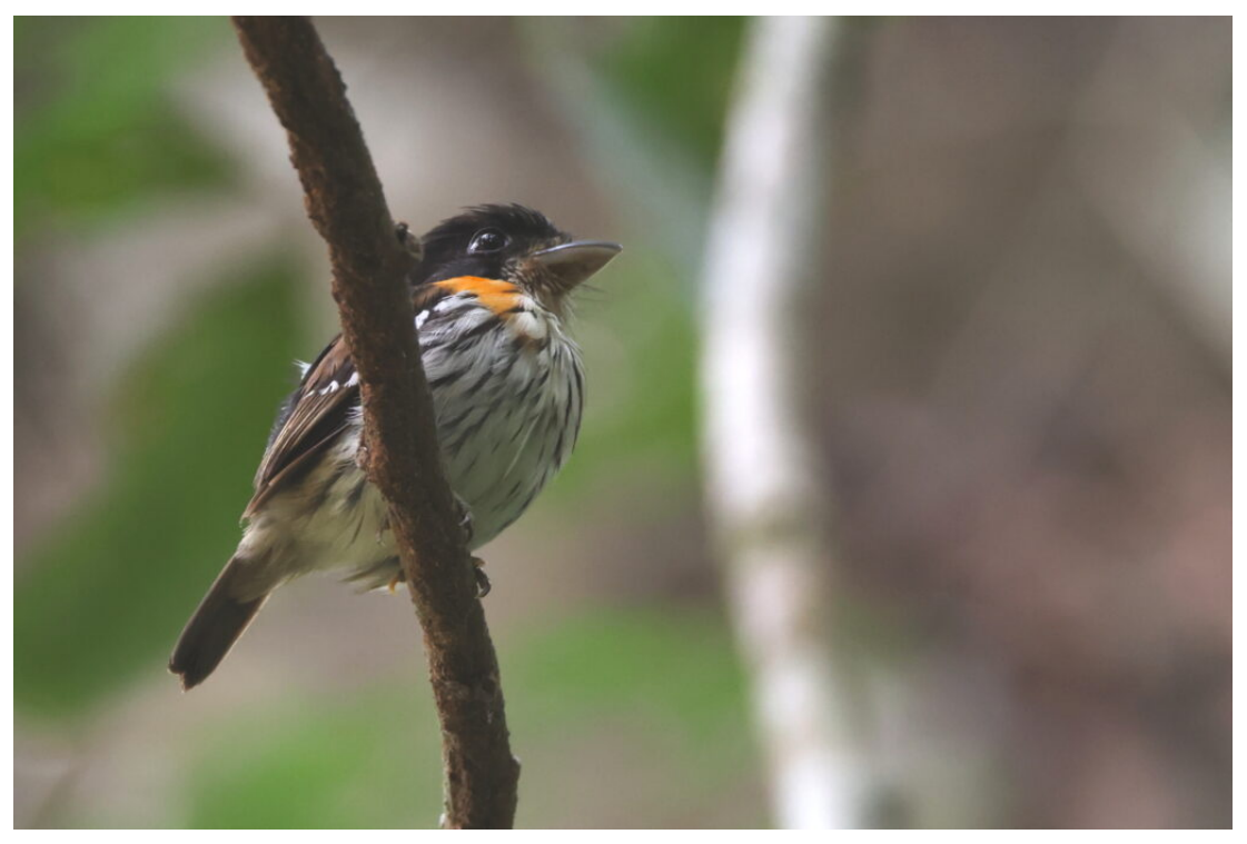
Rufous-sided Broadbill