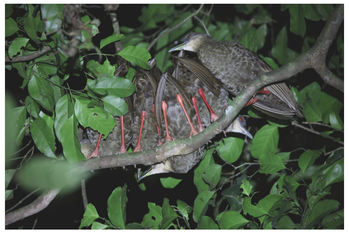
Nkulengu Rails