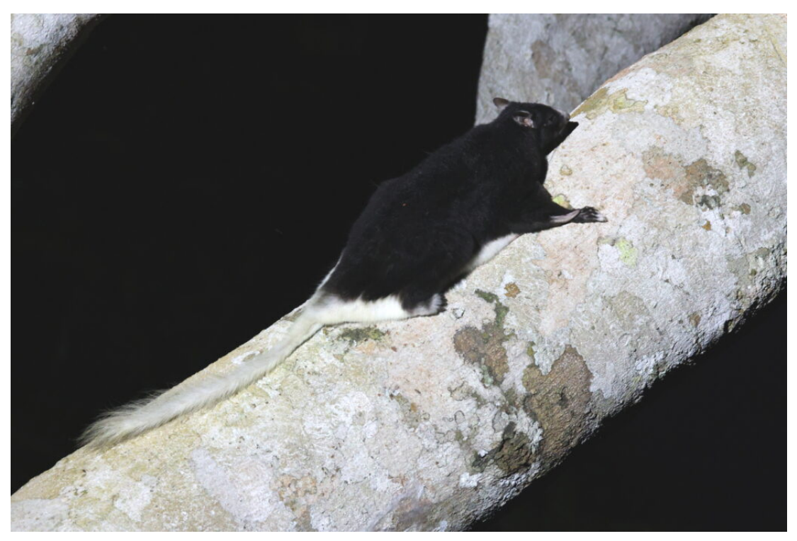
Pel's Anomalure