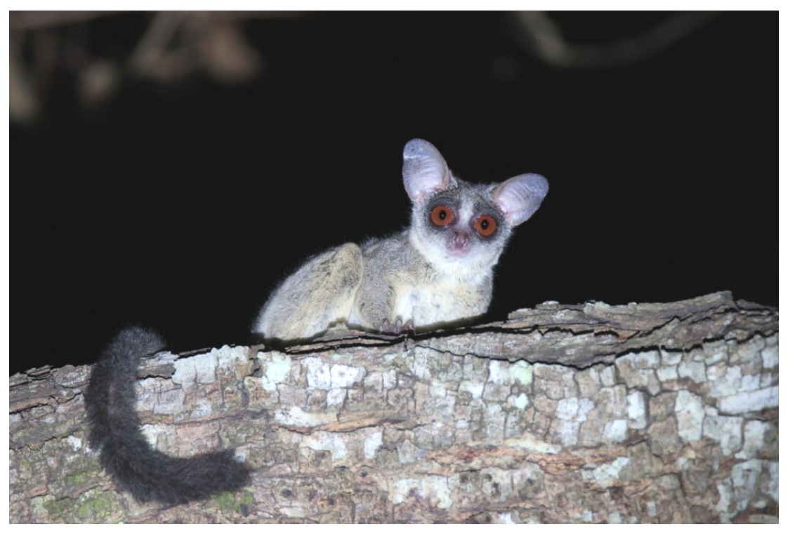
Senegal Galago