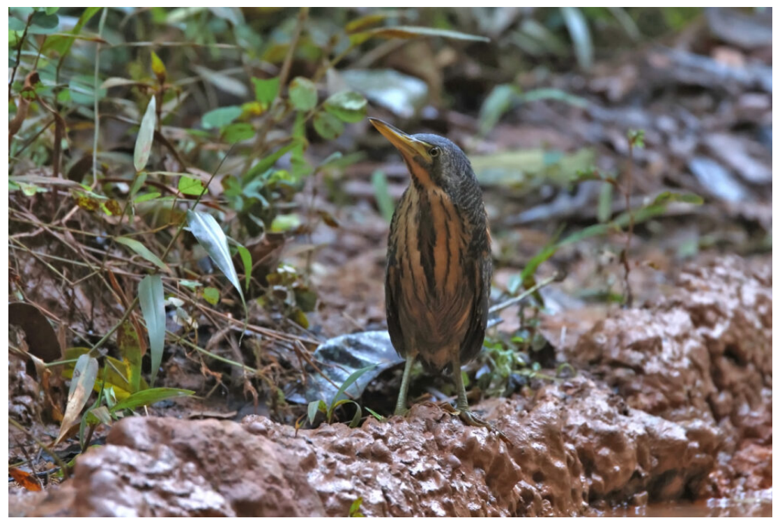
Dwarf Bittern