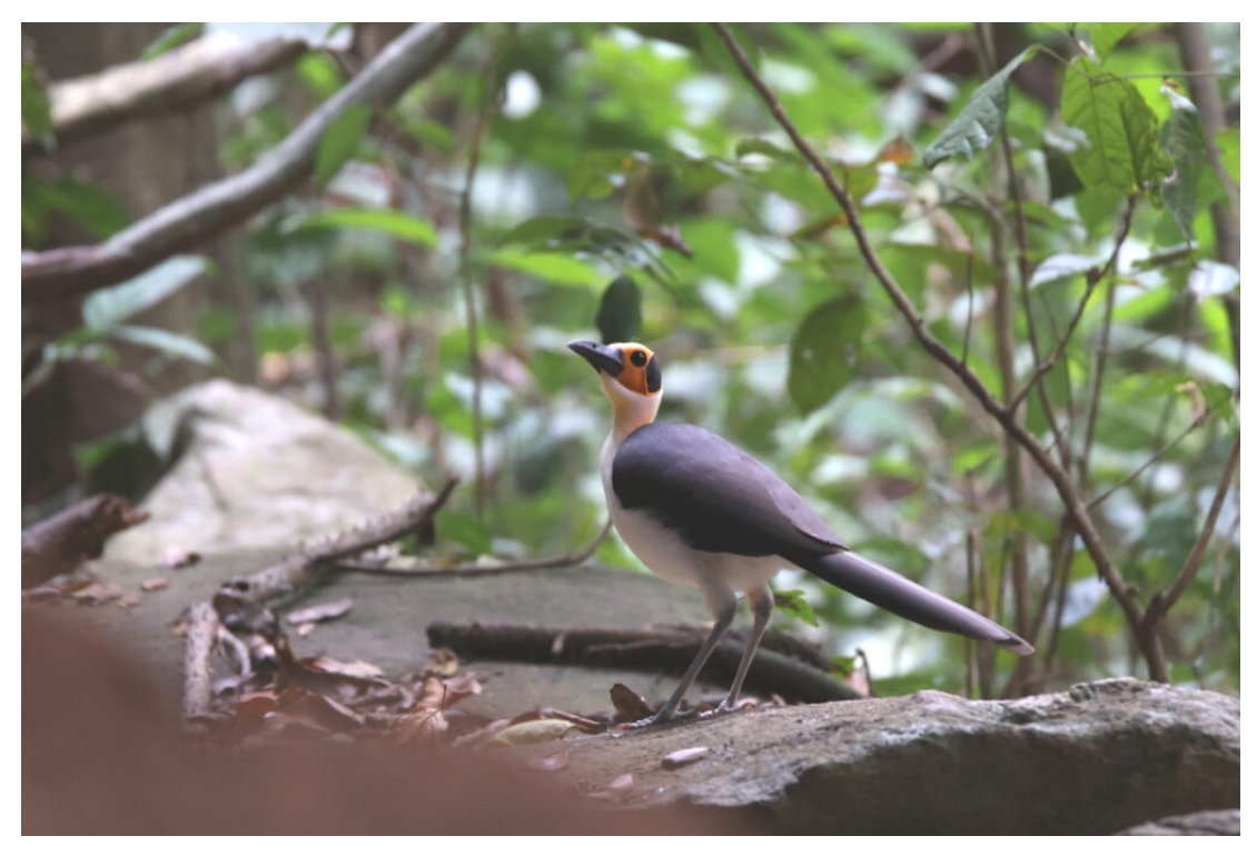
Yellow-headed Picathartes, Bonkro, Ghana

Gracile Tateril Taterillus gracilis Several were seen in the Mole NP.