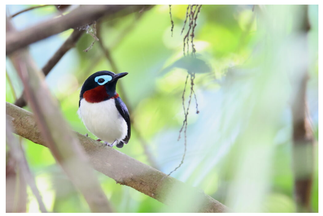
Red-cheeked Wattle-eye