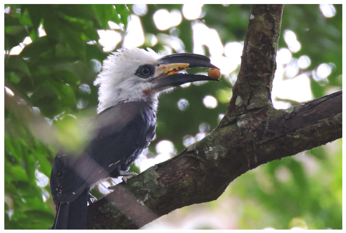
White-crested Hornbill