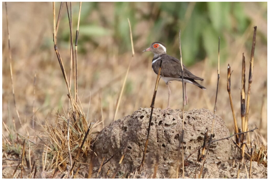
Forbes's Plover