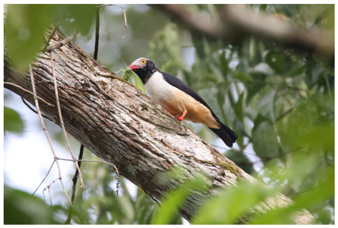
Red-billed Helmetshrike