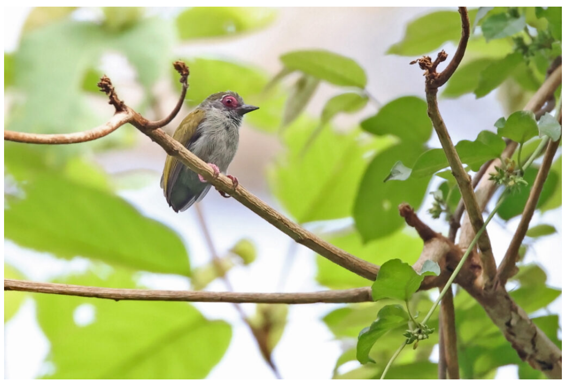
African Piculet