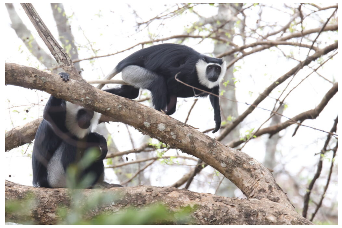
White-thighed Colobus