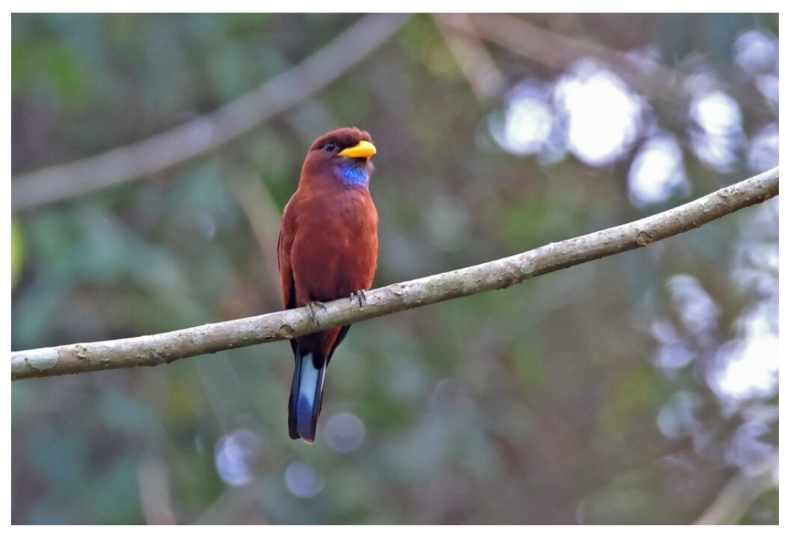
Blue-throated Roller