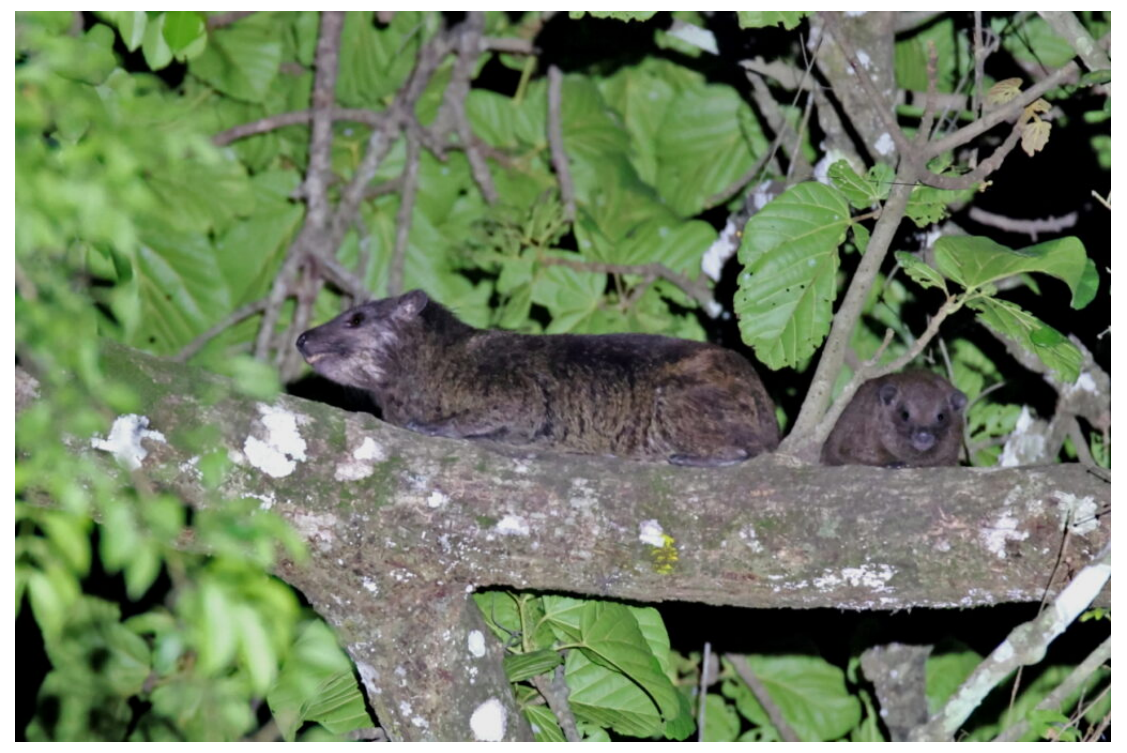
Benin Tree Hyrax