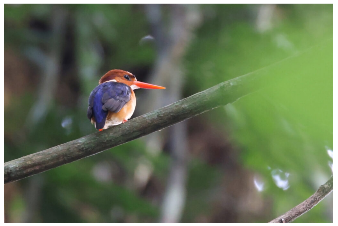
African Dwarf Kingfisher