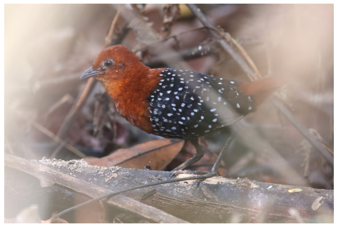
White-spotted Flufftail