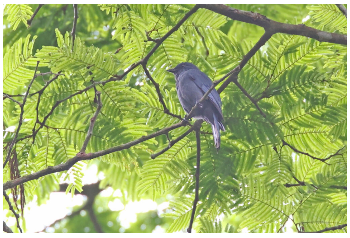
Nimba Flycatcher