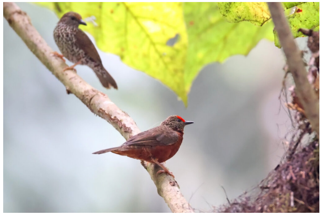
Red-fronted Antpeckers