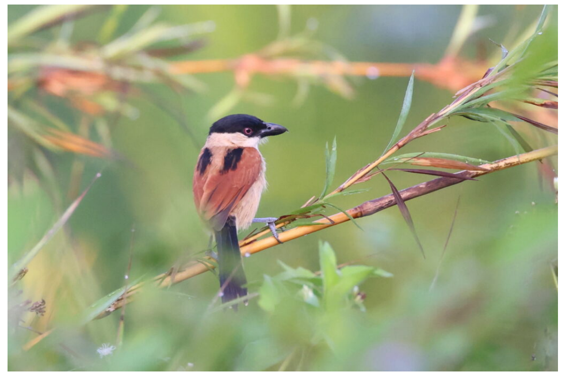
Marsh Tchagra