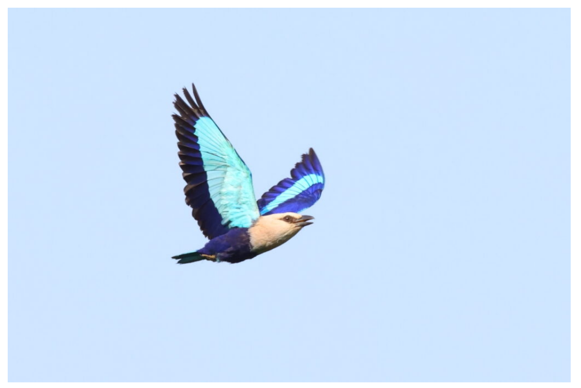
Blue-bellied Roller