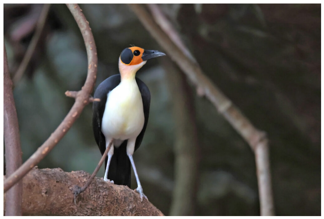
Yellow-headed Picathartes, Bonkro, Ghana