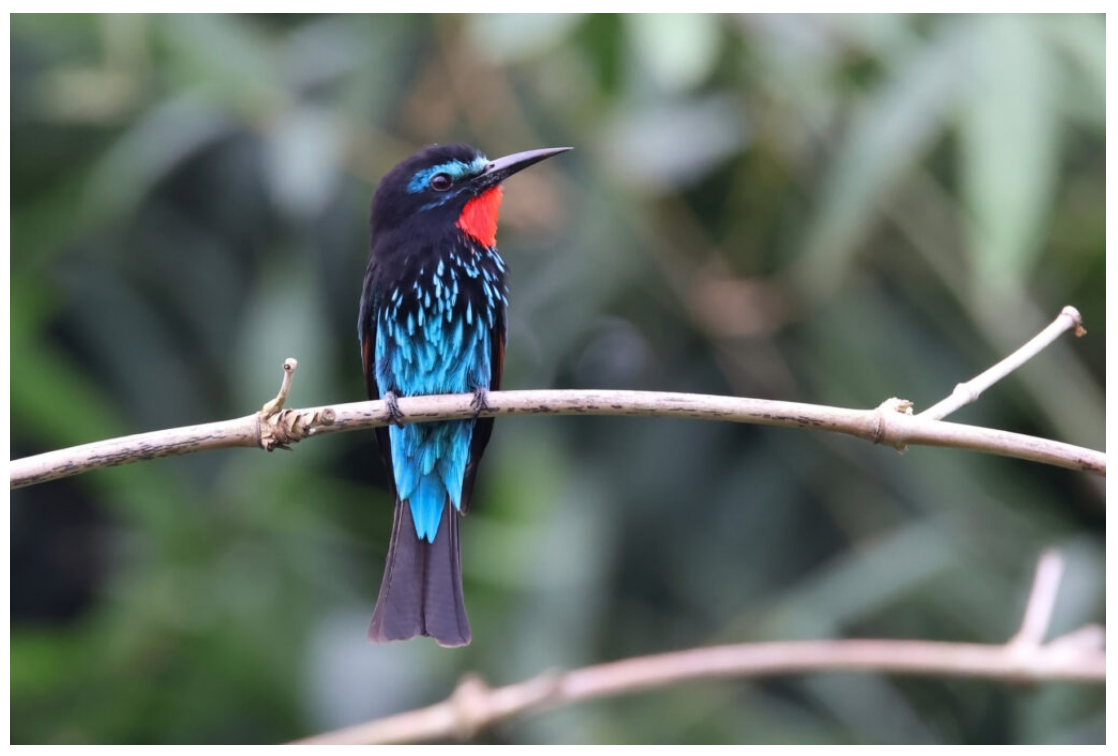
Black Bee-eater