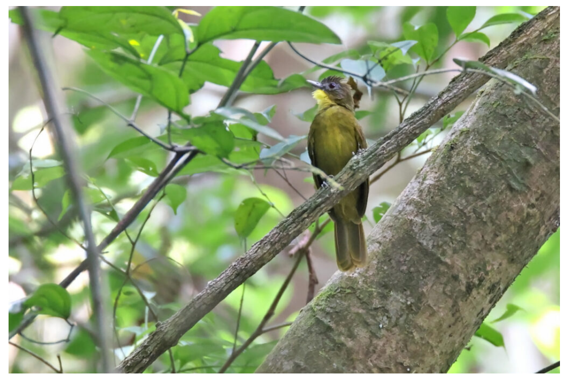
Yellow-bearded Greenbul