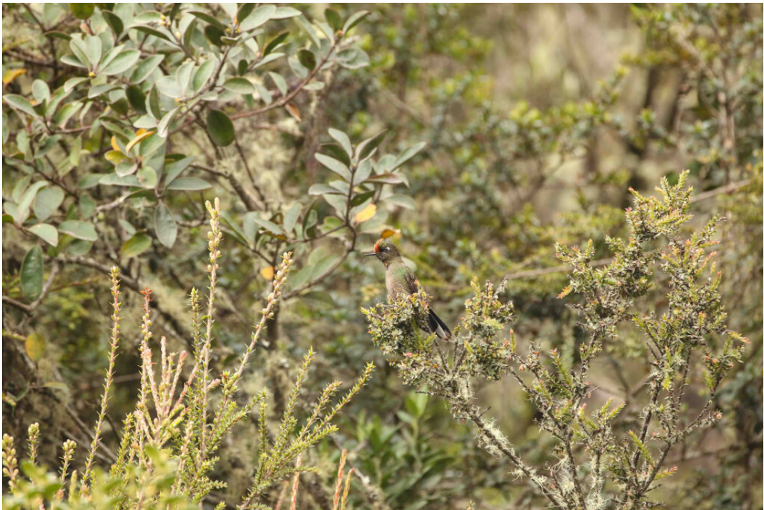
Rainbow-bearded Thornbill