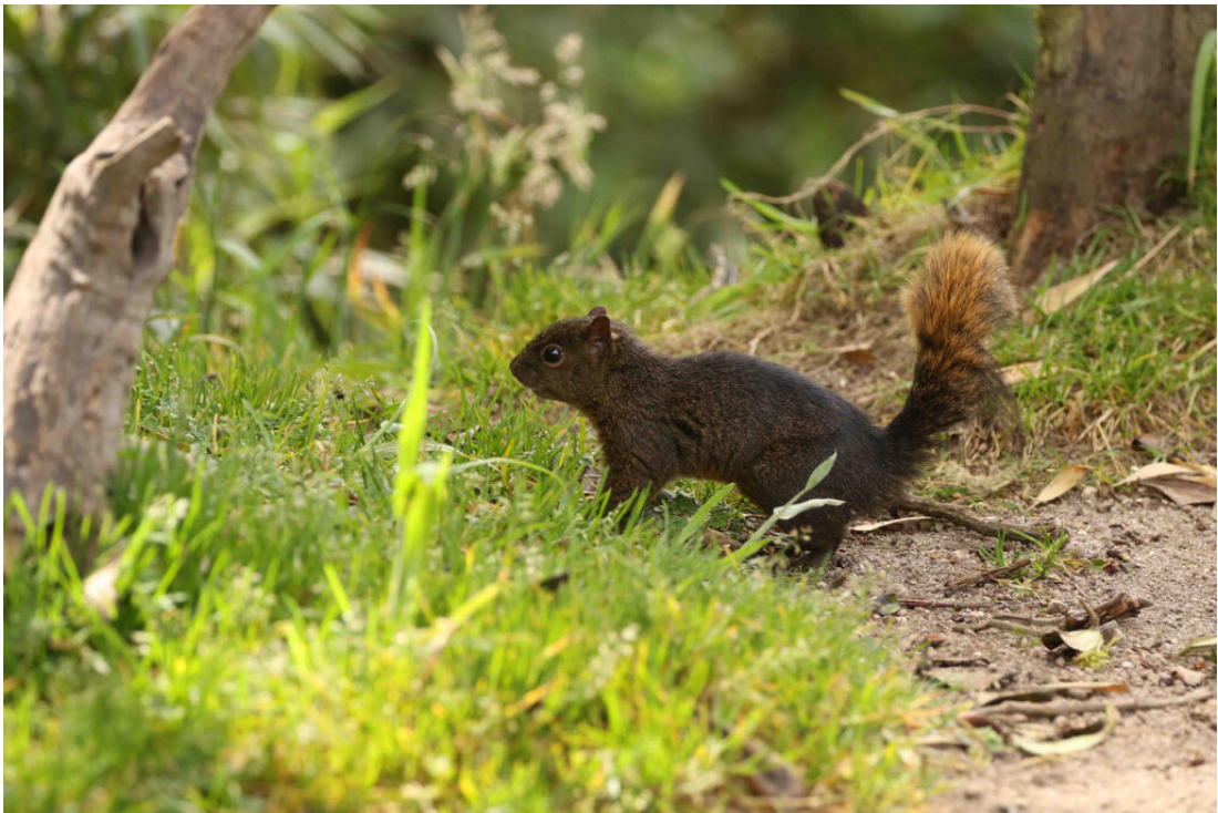
Andean Squirrel