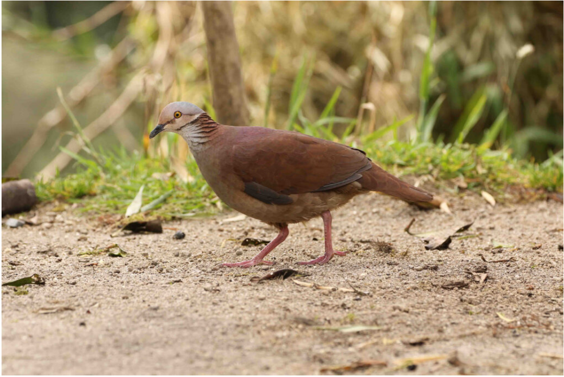
White-throated Quail-Dove