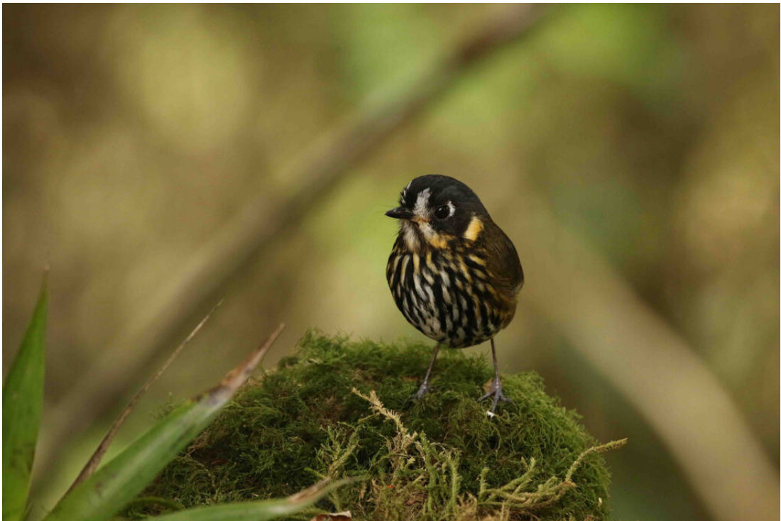
Crescent-faced Antpitta