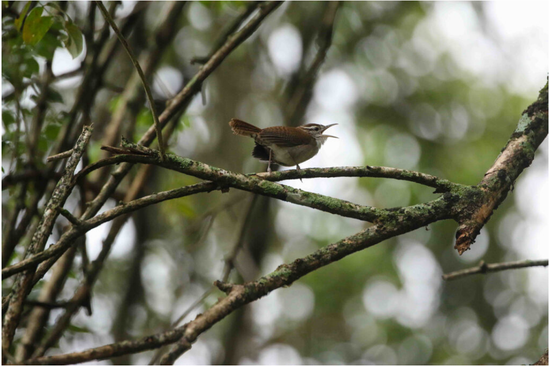
Antioquia Wren