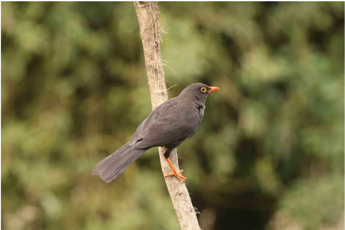
Great Thrush