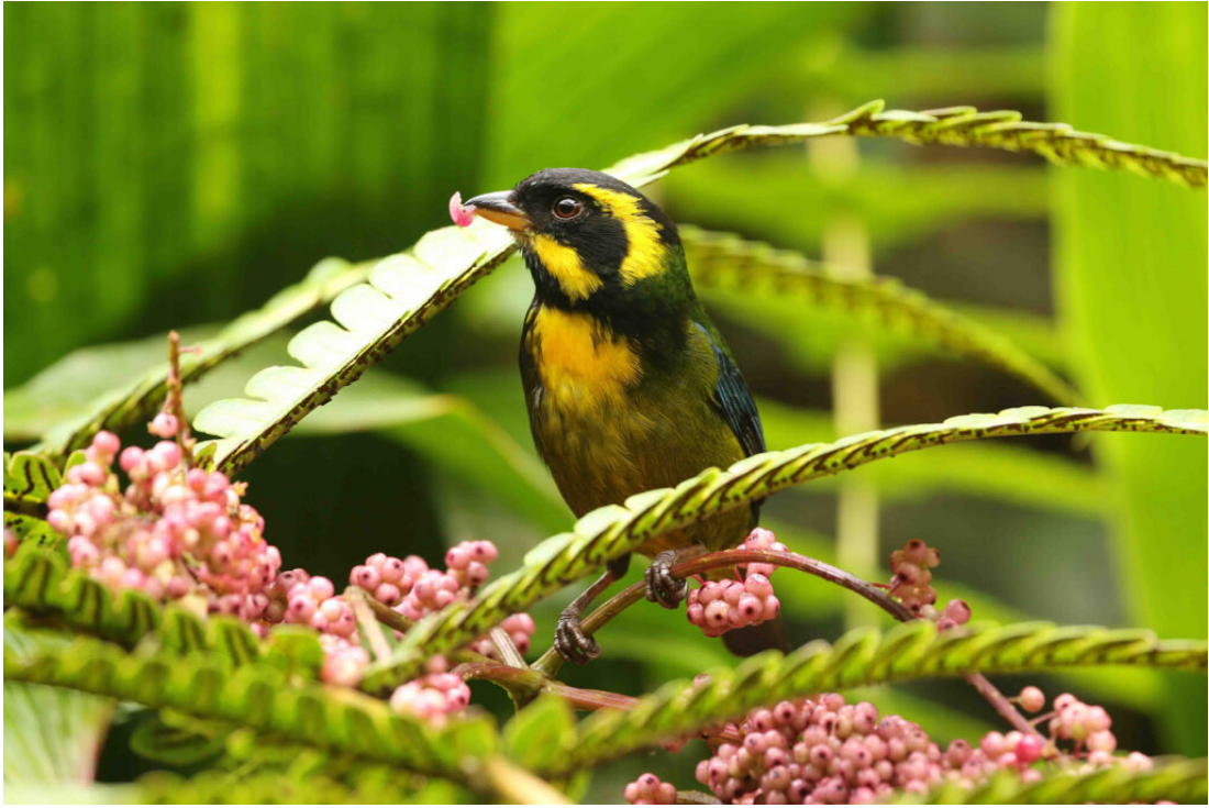
Gold-ringed Tanager