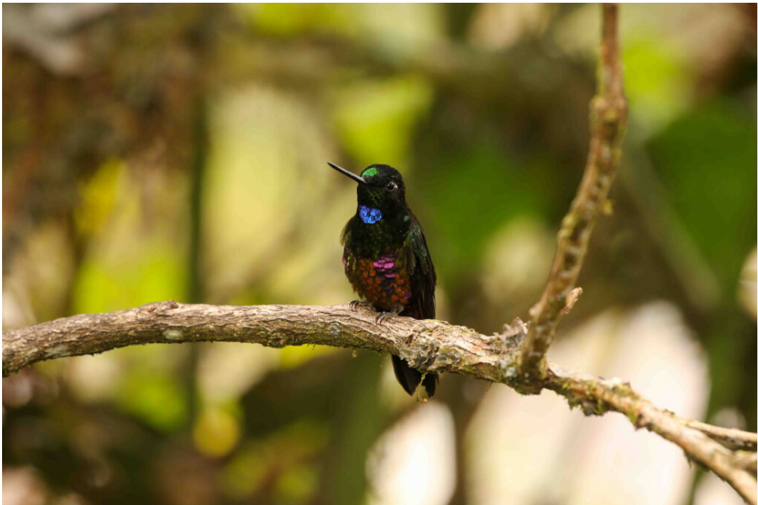
Blue-throated Starfrontlet