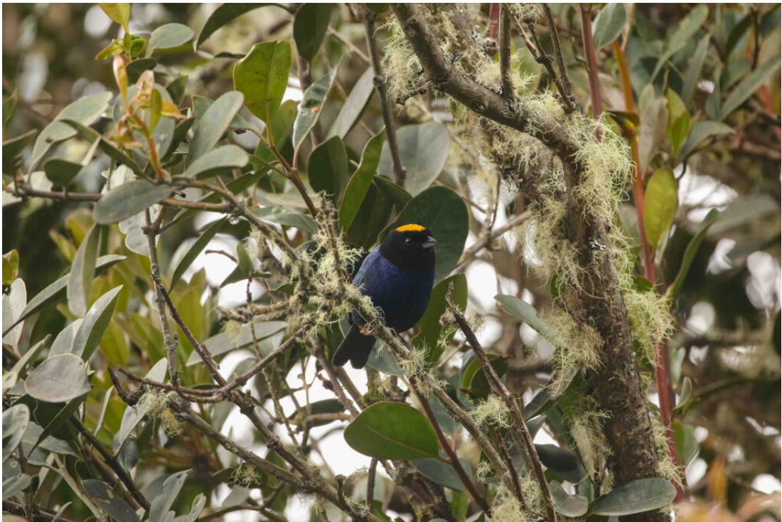
Golden-crowned Tanager