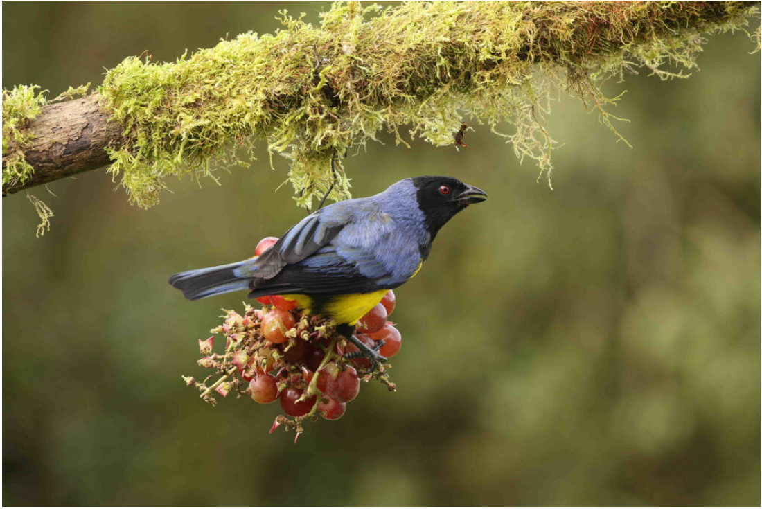
Hooded Mountain Tanager