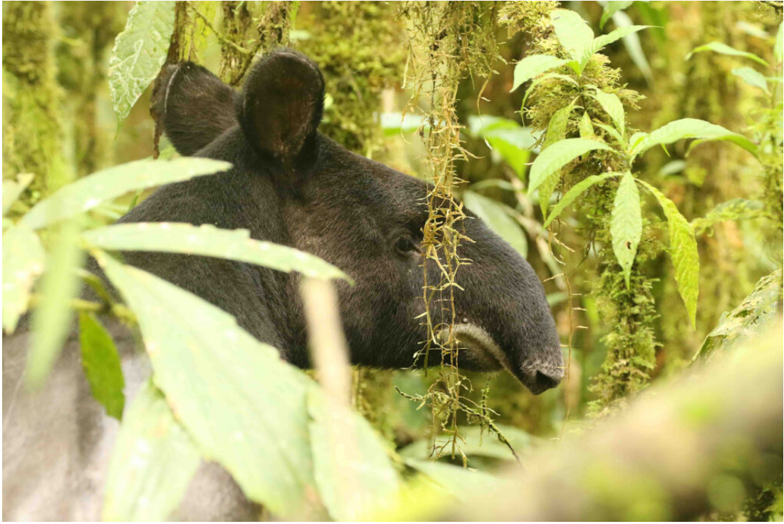
Mountain Tapir