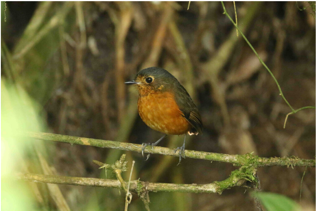
Slaty-crowned Antpitta