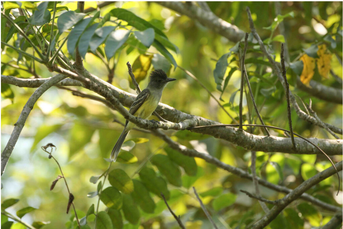
Apical Flycatcher