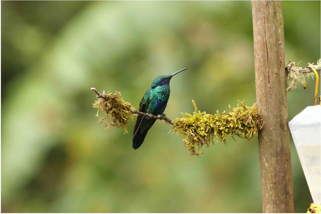
Sparkling Violetear