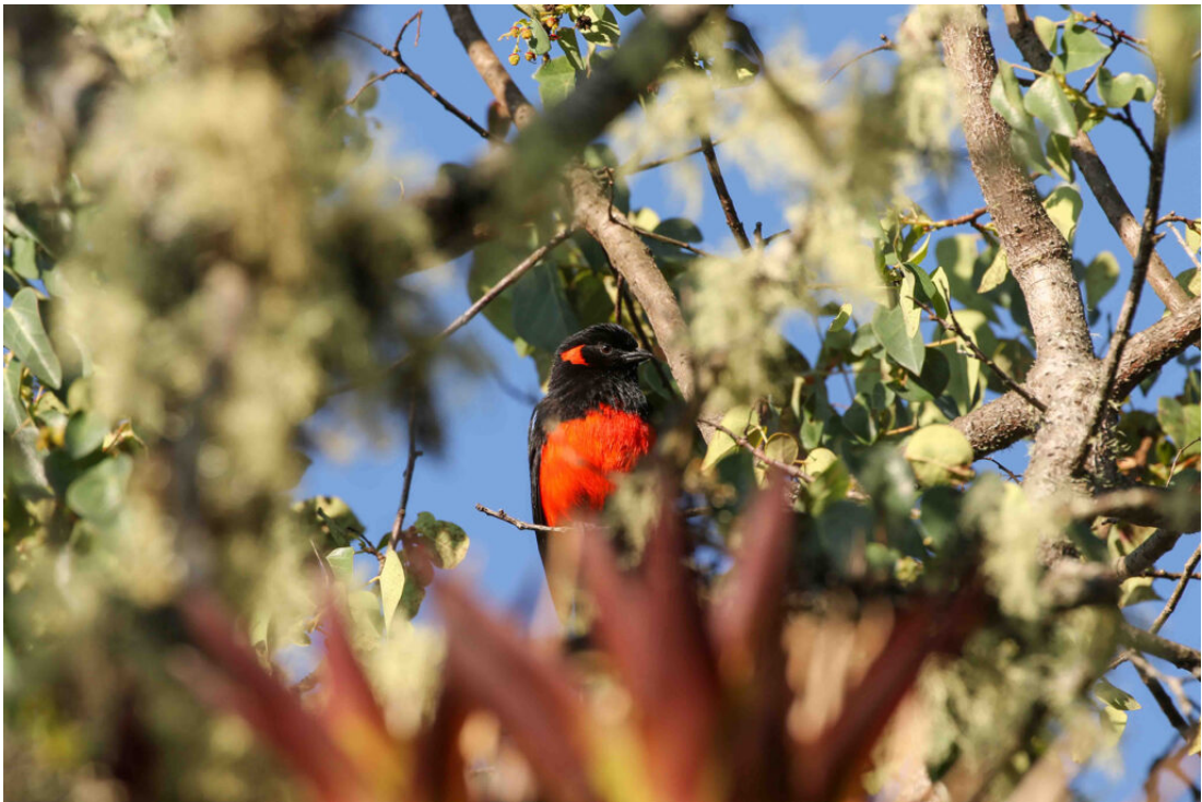
Scarlet-bellied Mountain Tanager