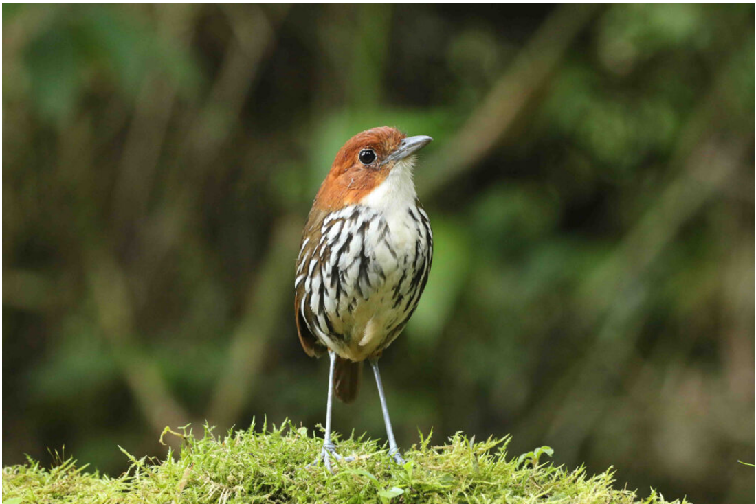
Chestnut-crowned Antpitta