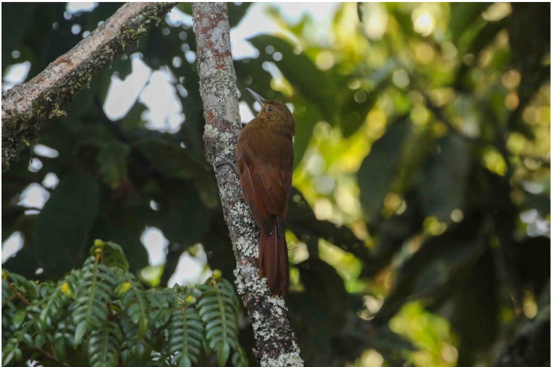
Tyrannine Woodcreeper