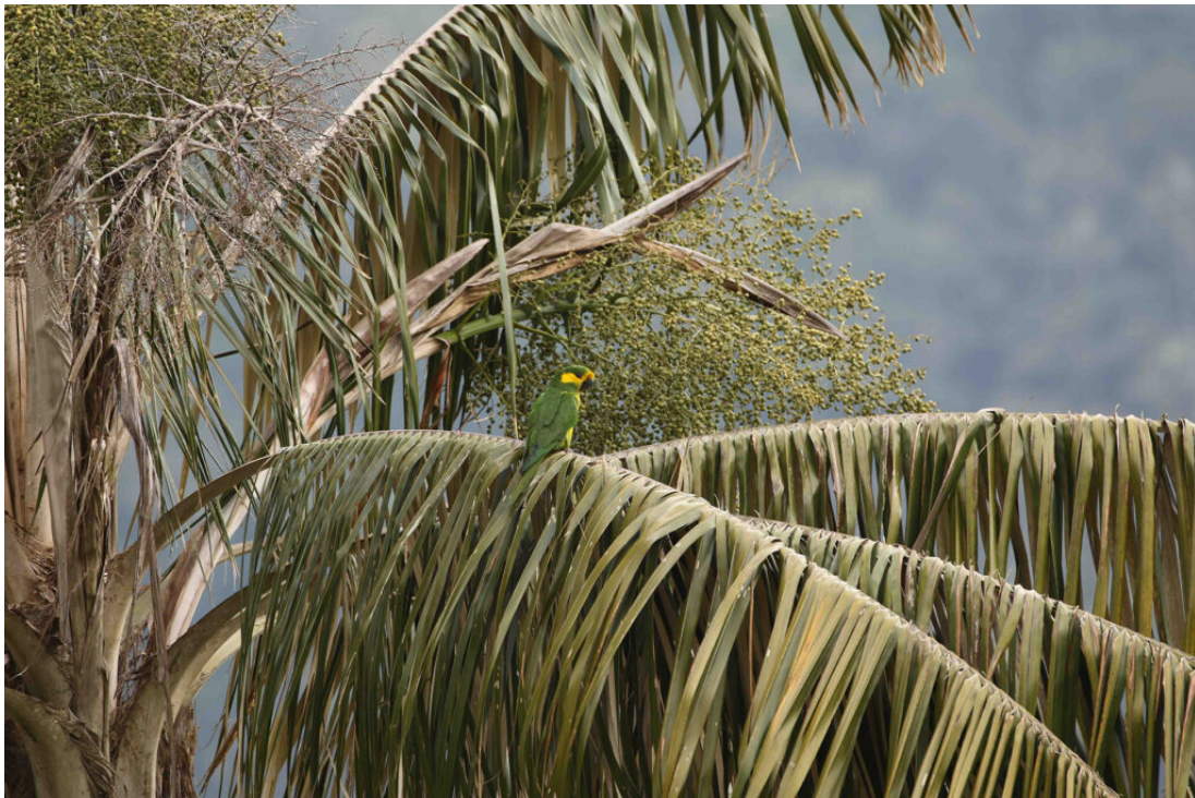
Yellow-eared Parrot

Amazon Dwarf Squirrel Microsciurus flaviventer A Dwarf Squirrel that we saw in the central Andes near Cajamarca probably relates to the Otinus race of Amazon Dwarf Squirrel.