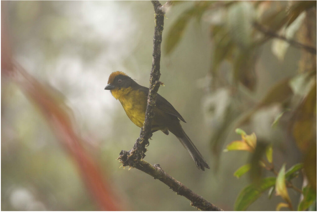
Choco Brushfinch