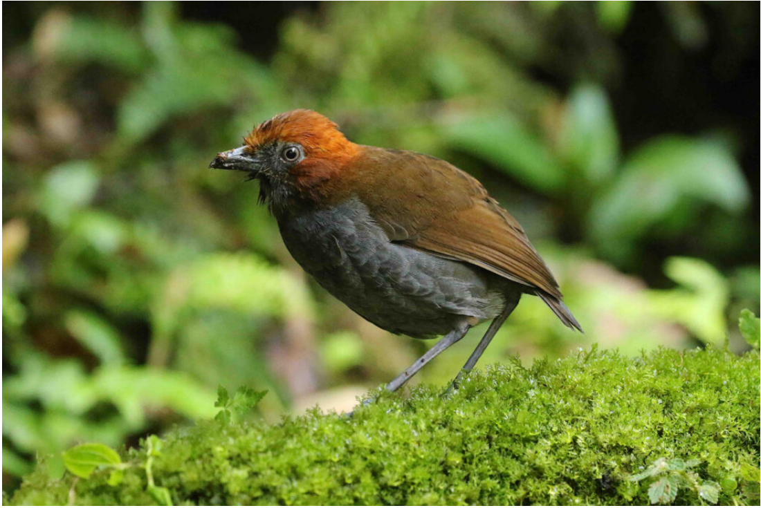
Chestnut-naped Antpitta