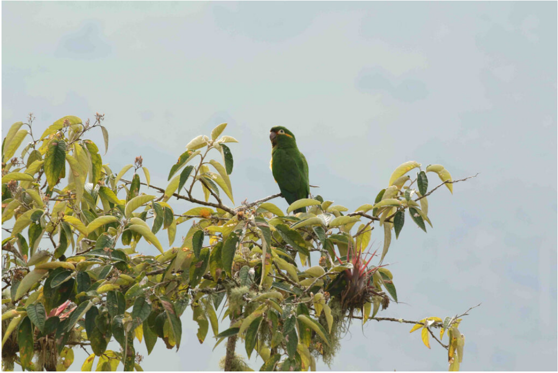
Golden-plumed Parakeet