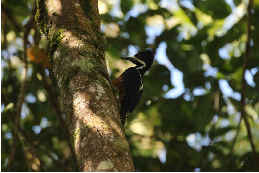
Powerful Woodpecker