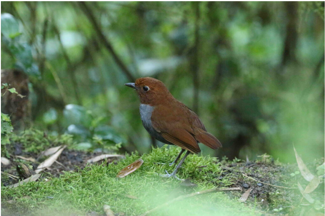
Bicoloured Antpitta