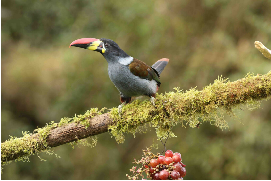
Grey-breasted Mountain Toucan