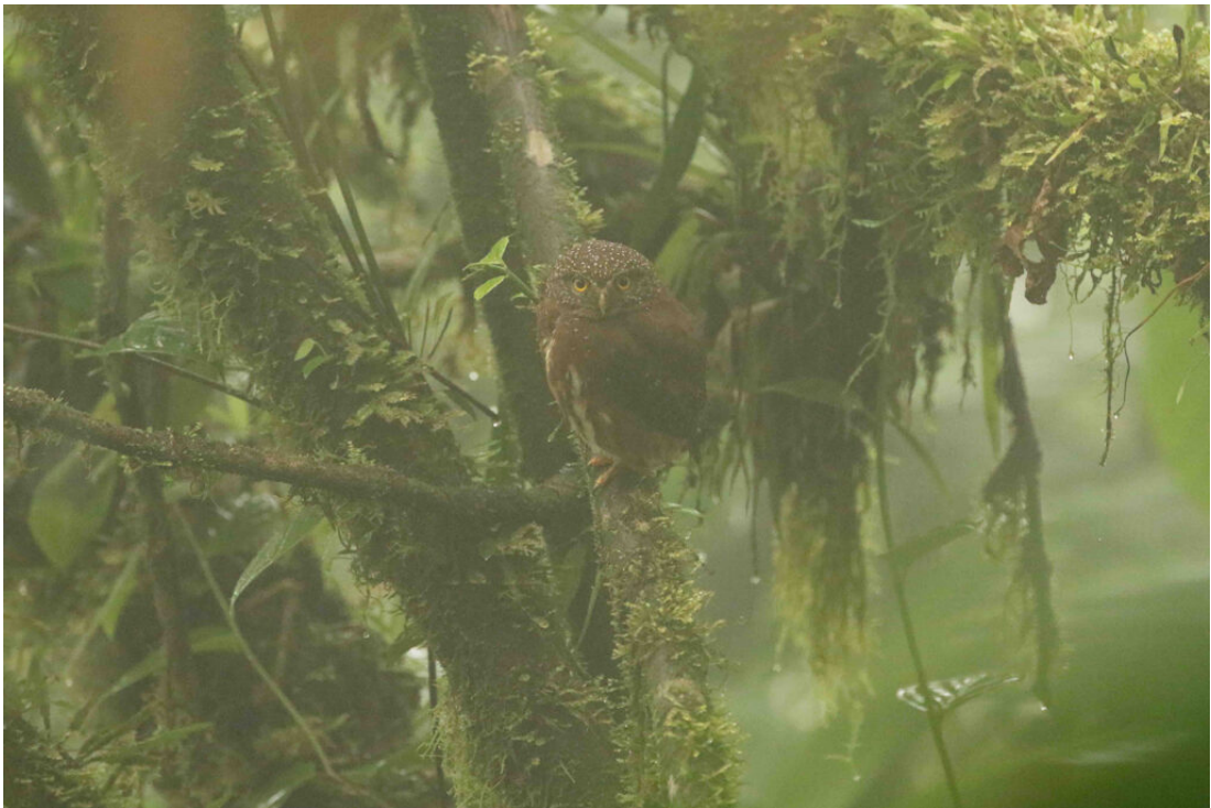
Cloud Forest Pygmy Owl