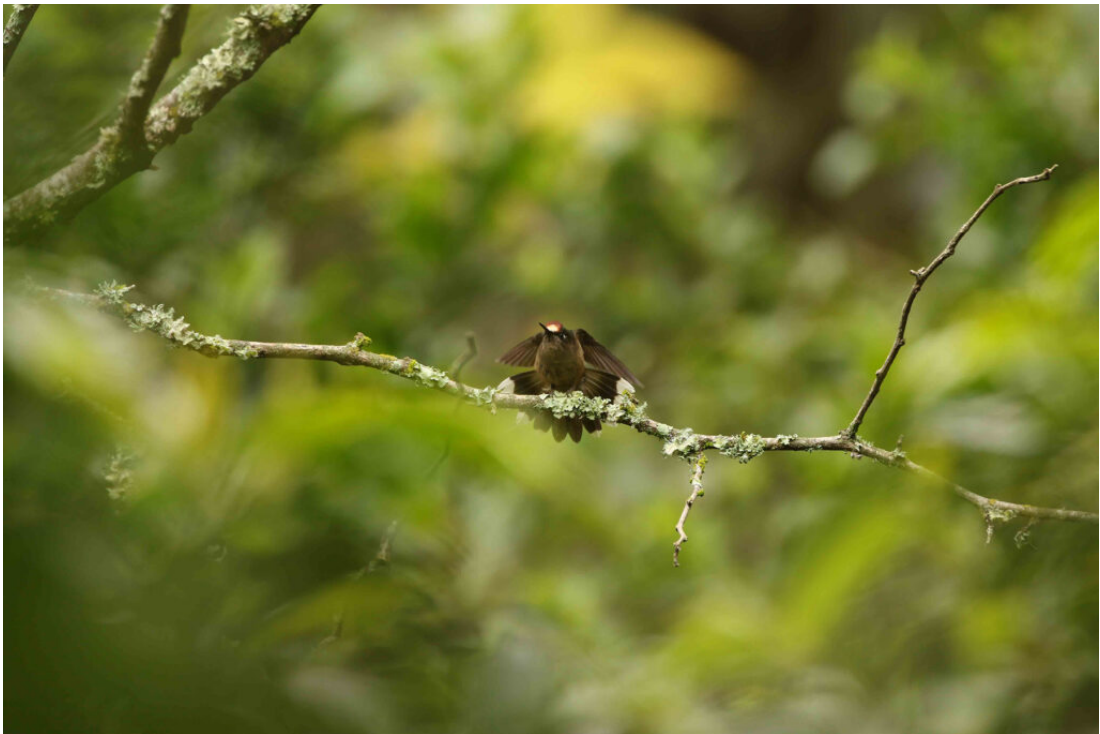
Tolima Blossomcrown (image by Trevor Ellery)