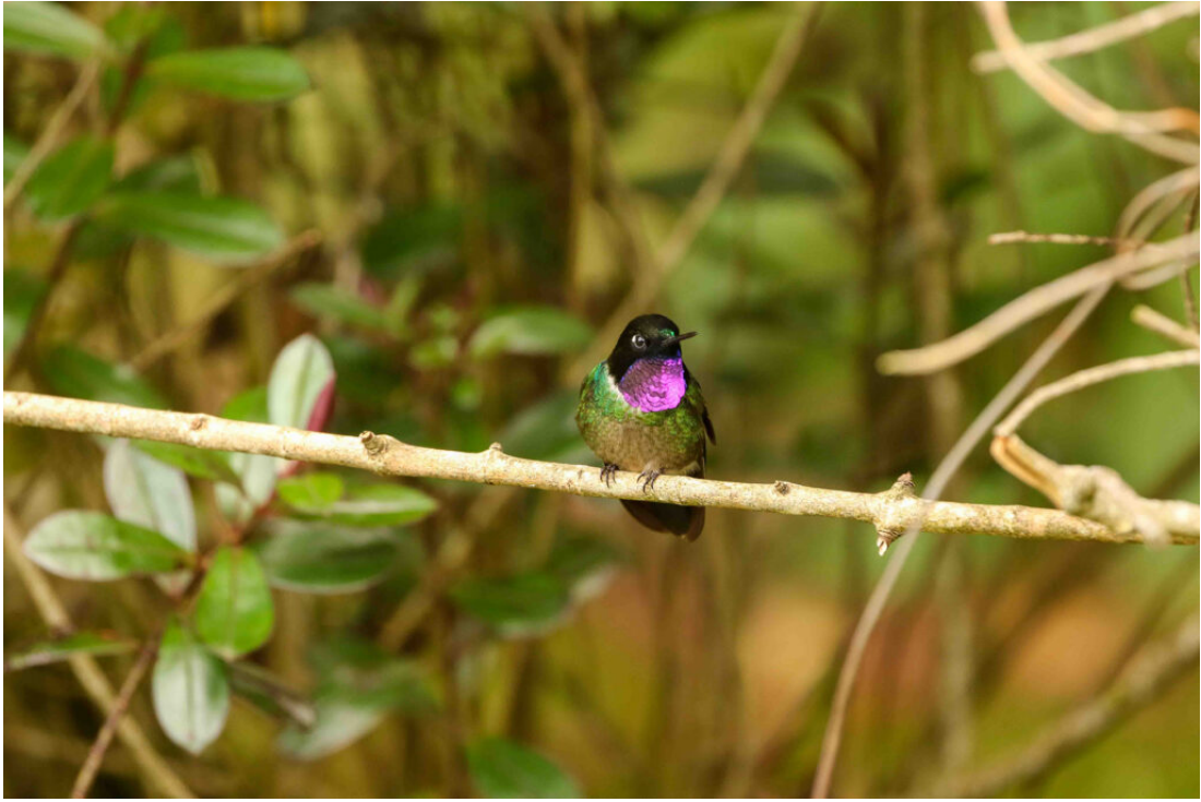
Longuemare's Sunangel