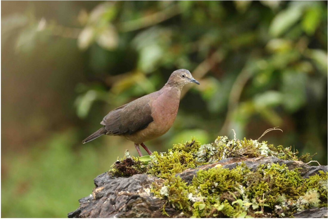
Tolima Dove