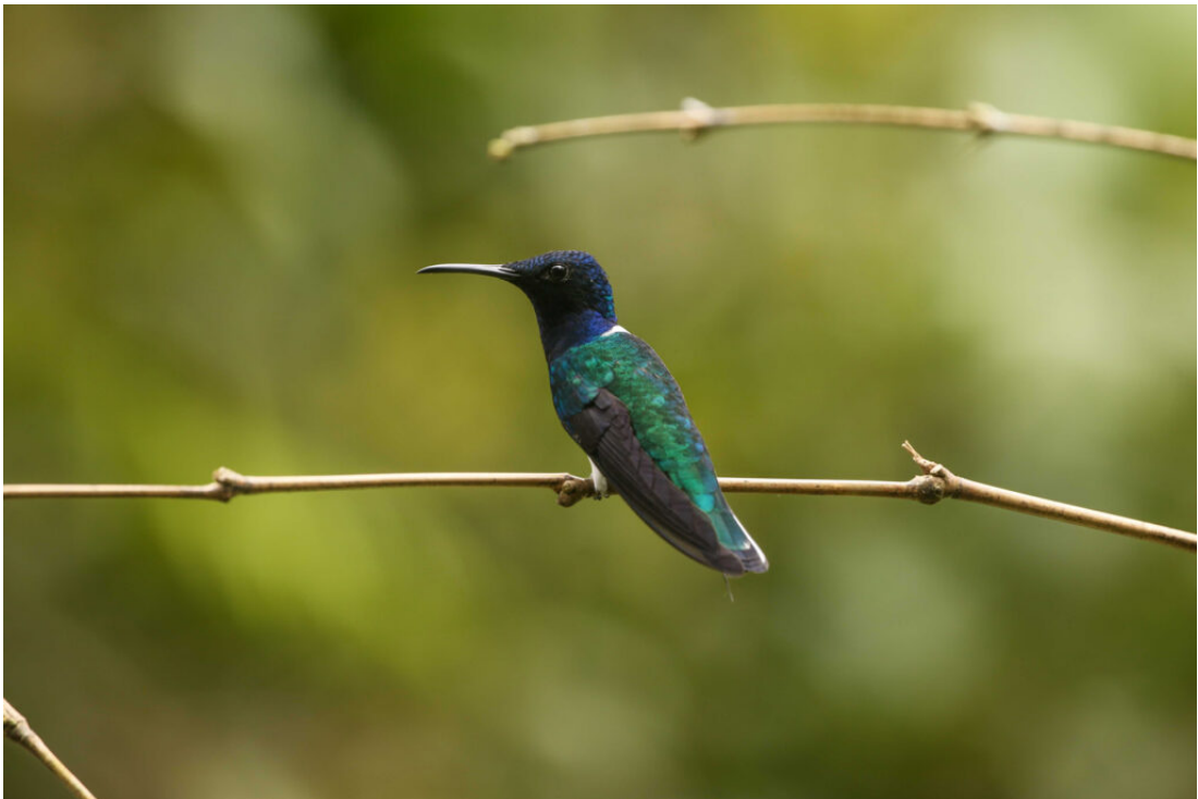
White-necked Jacobin