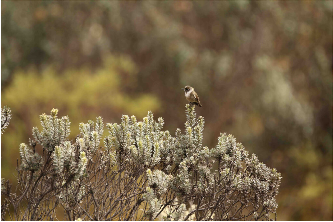
Green-bearded Helmetcrest