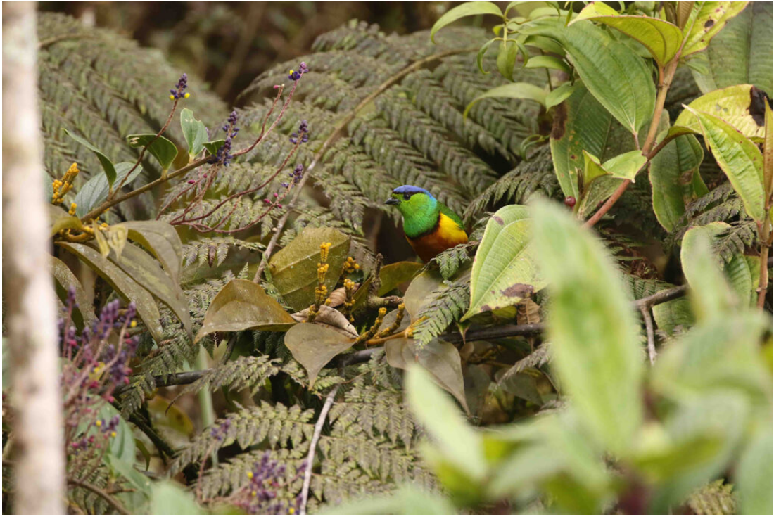
Chestnut-breasted Chlorophonia