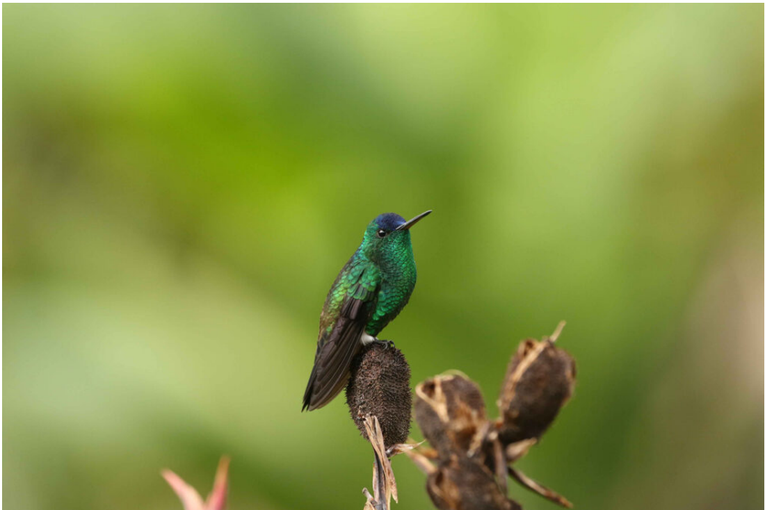
Indigo-capped Hummingbird