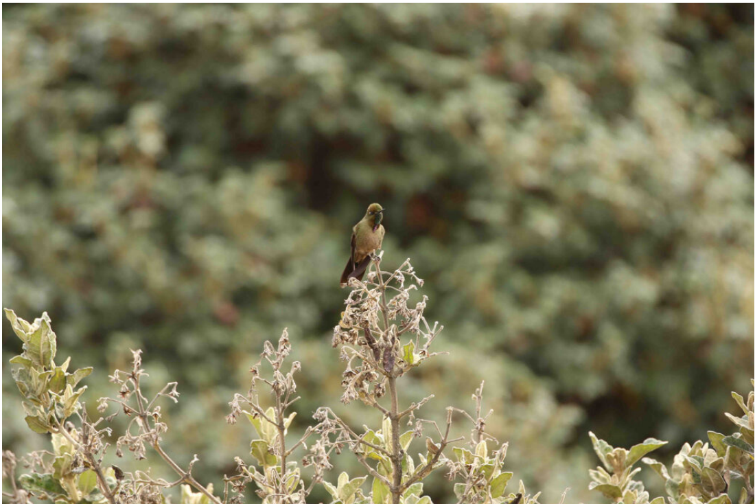
Bronze-tailed Hornbill (image by Trevor Ellery)