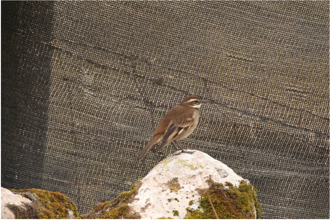
Chestnut-winged Cinclodes