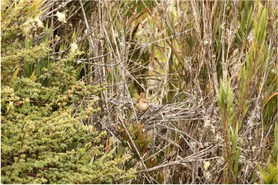
Apolinar's Wren