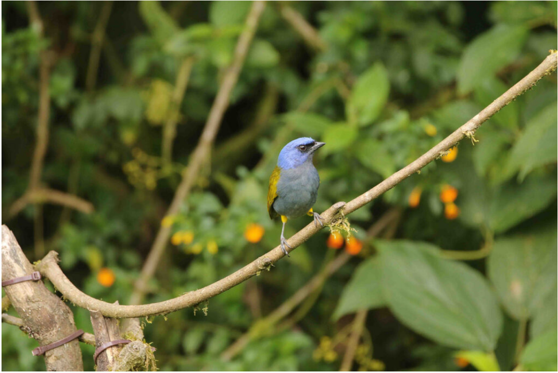
Blue-capped Tanager