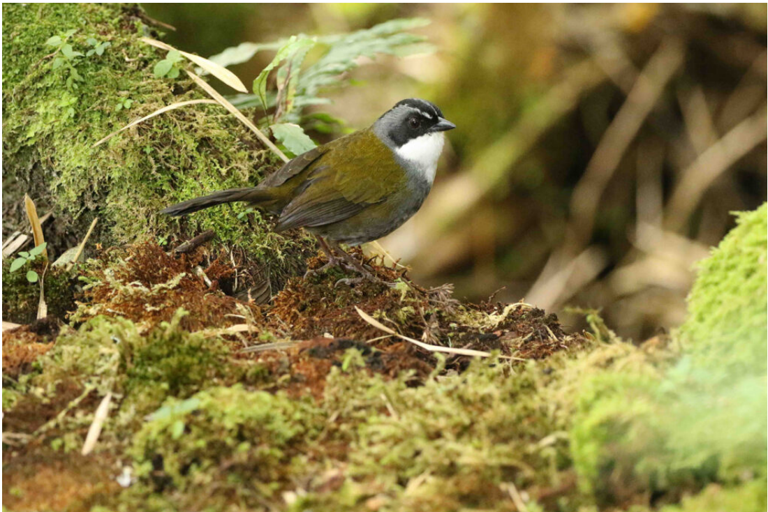
Grey-browed Brushfinch