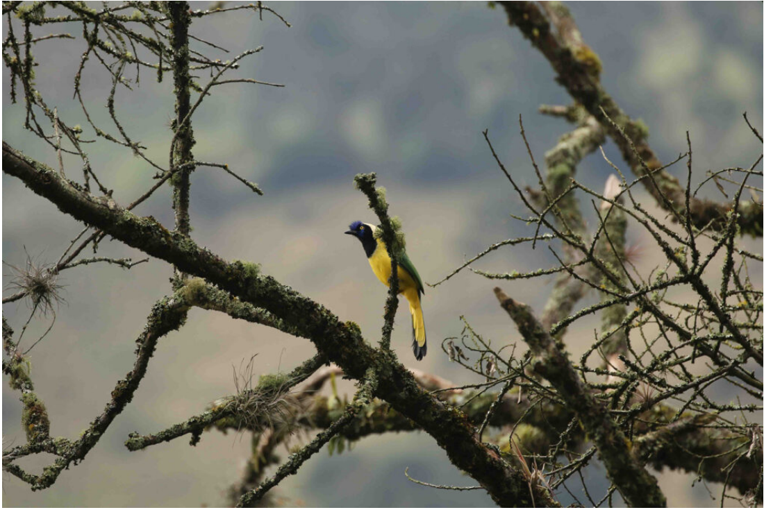
Inca Jay