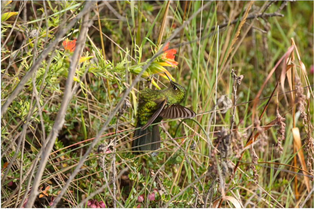
Viridian Metaltail