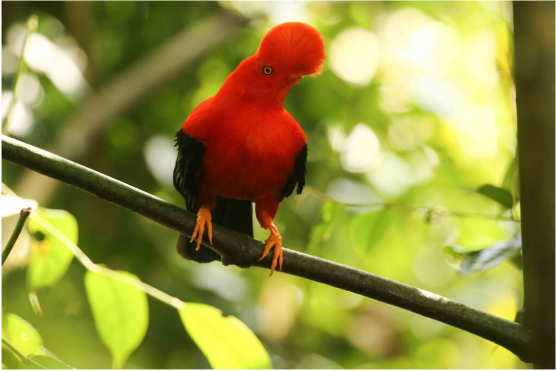
Andean Cock-of-the-rock