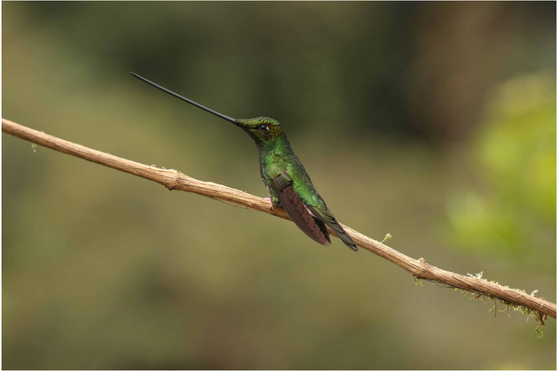
Sword-billed Hummingbird