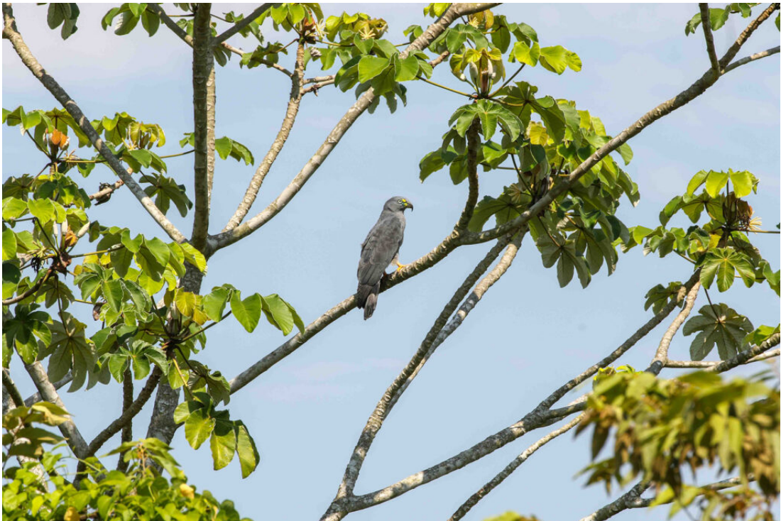
Hook-billed Kite