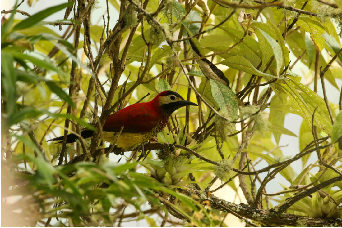
Crimson-mantled Woodpecker