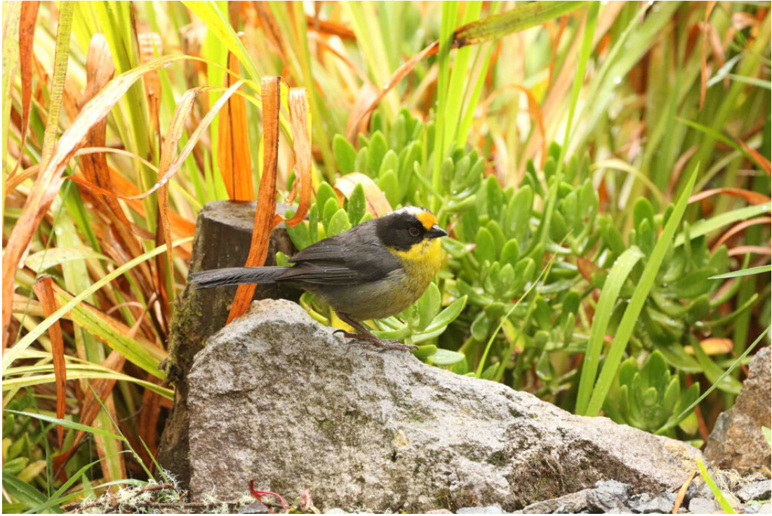
Pale-naped Brushfinch