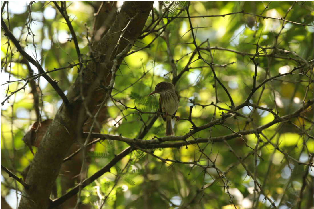
Pearly-vented Tody-Tyrant