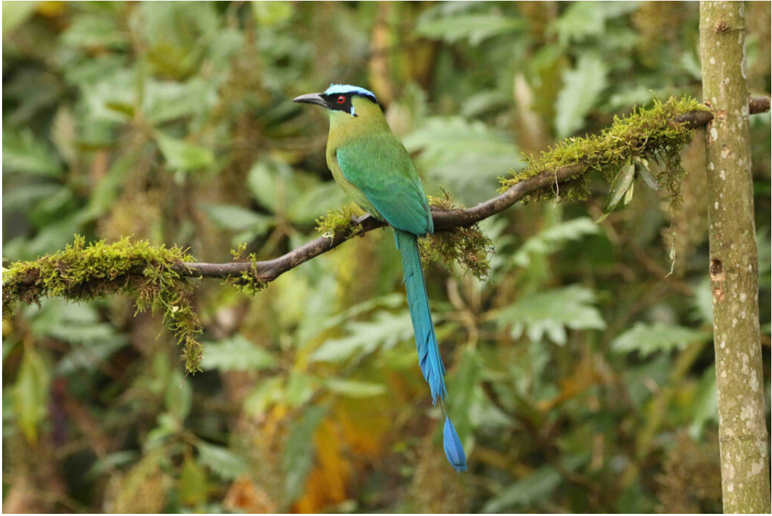
Andean Motmot