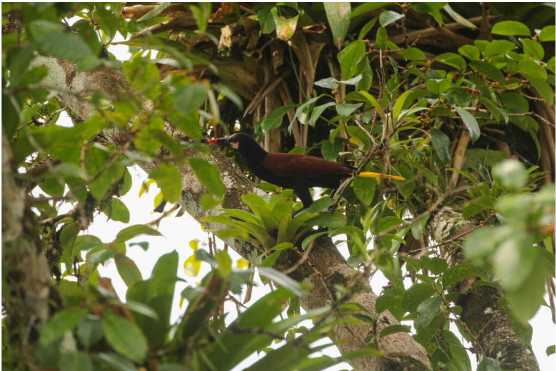
Baudo Oropendola