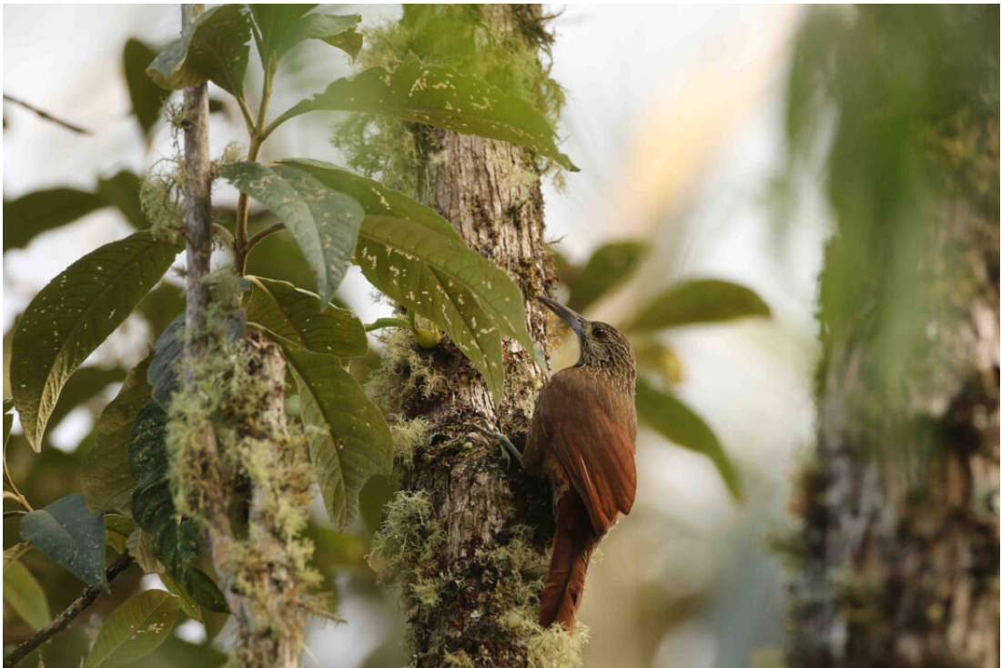
Strong-billed Woodcreeper