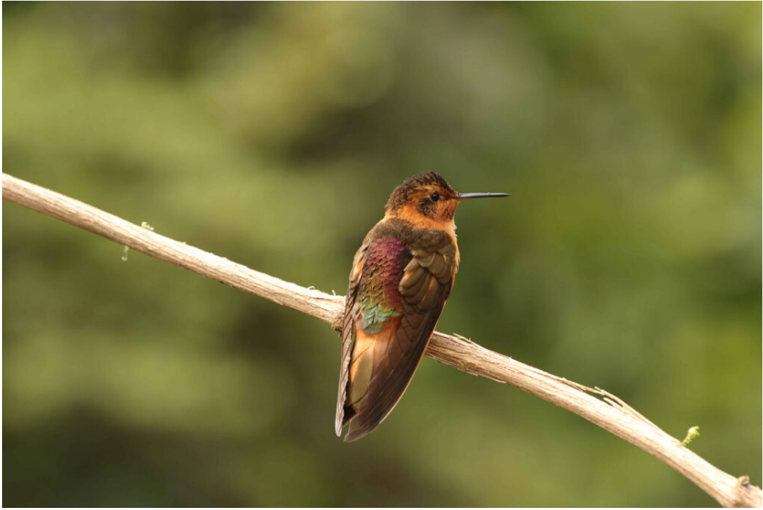
Shining Sunbeam