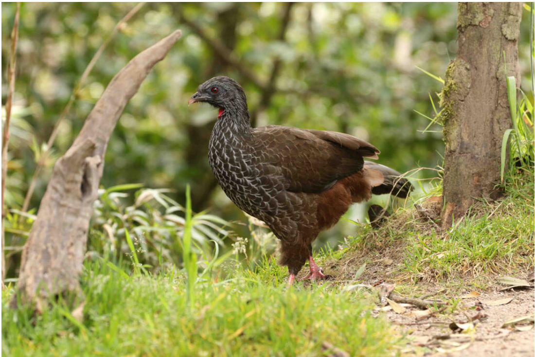
Andean Guan