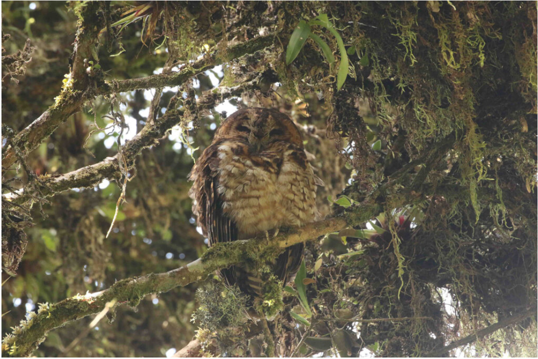
Rufous-banded Owl