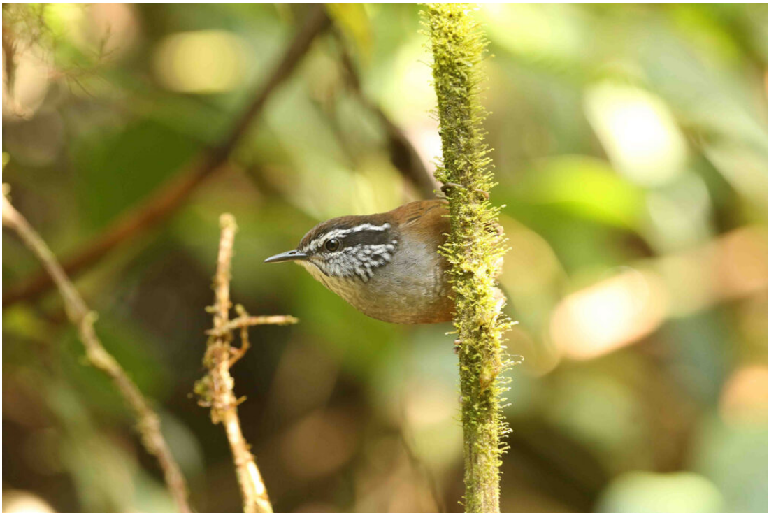
Munchique Wood Wren