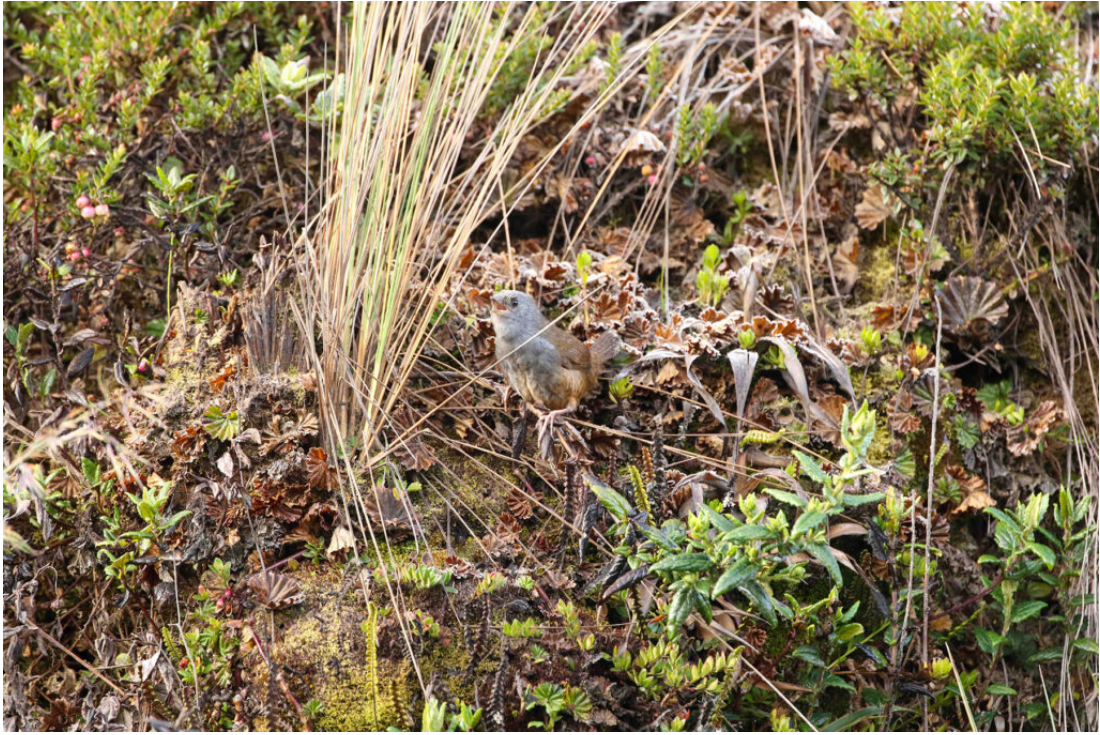
Paramo Tapaculo