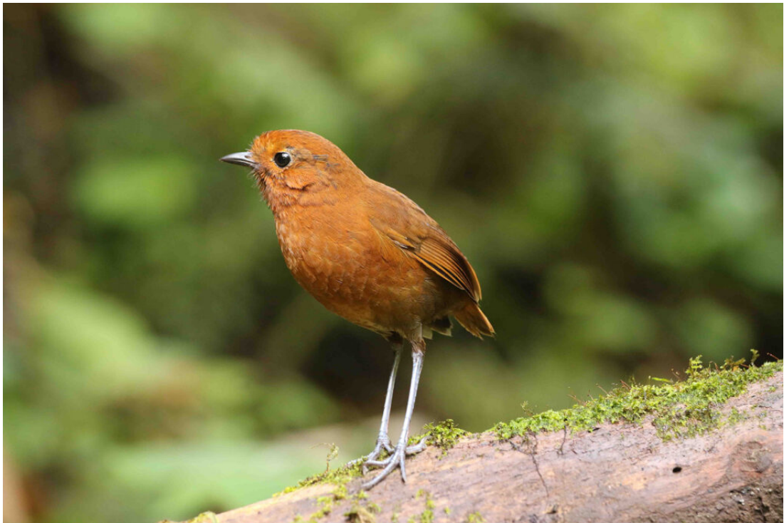
Chami Antpitta