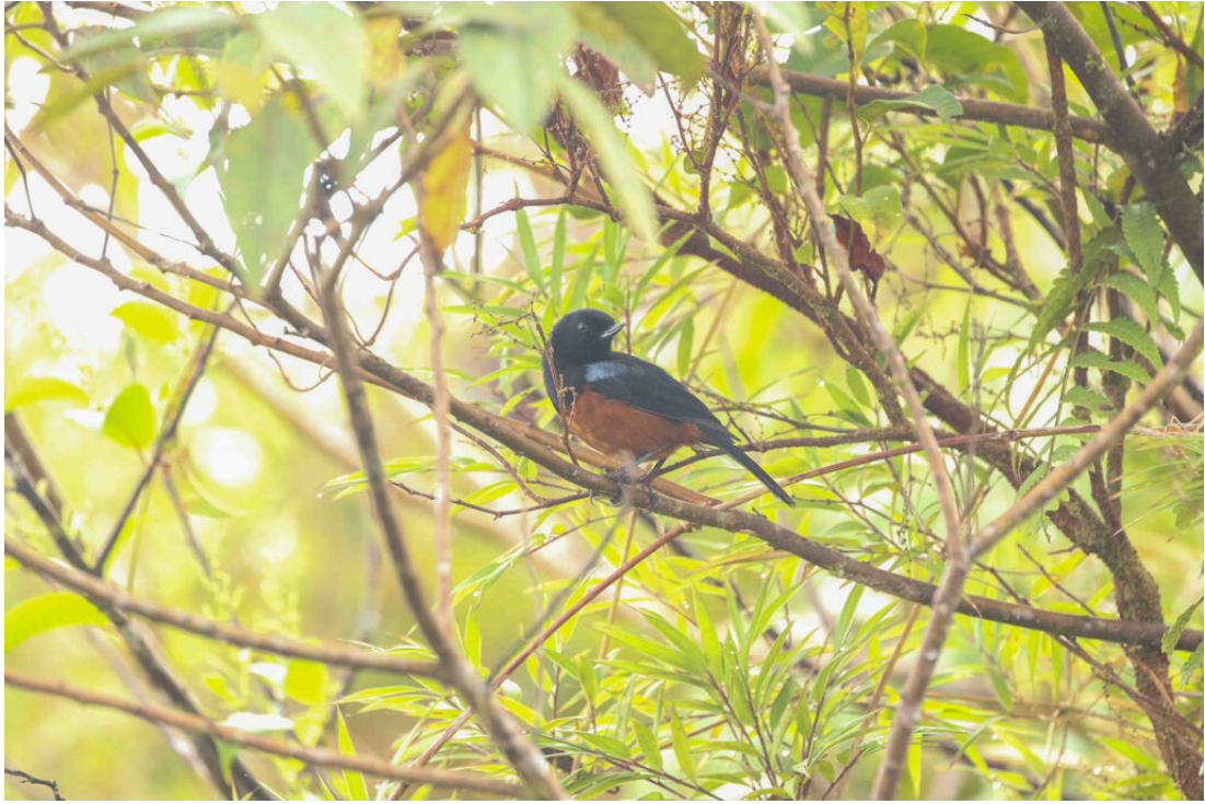
Chestnut-bellied Flowerpiercer