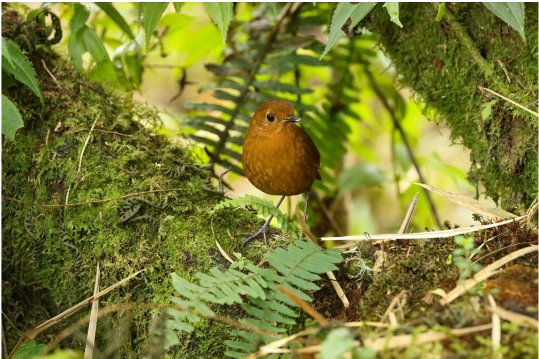
Equatorial Antpitta