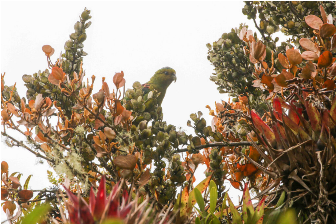
Fuertes's Parrot (image by Trevor Ellery)