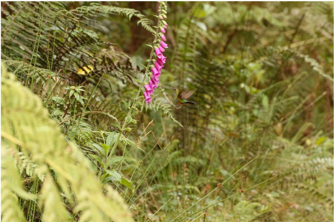
Mountain Avocetbill