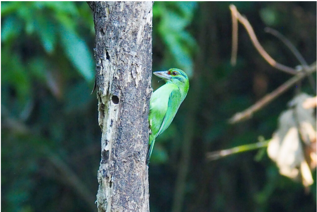
Moustached Barbet