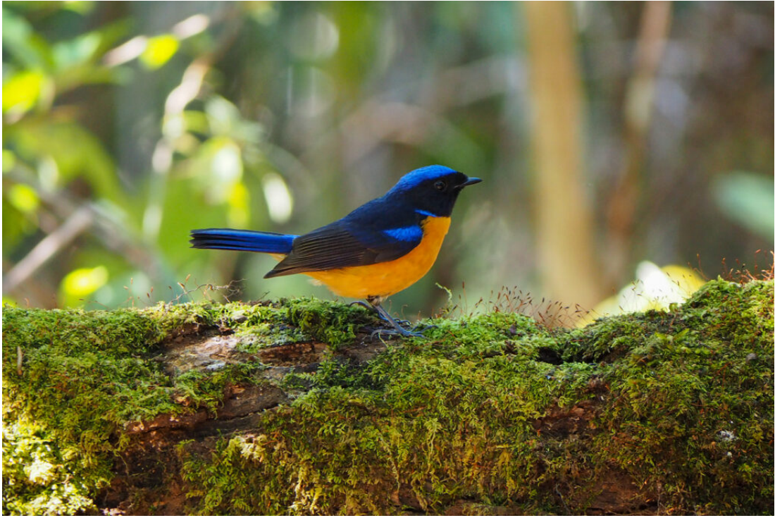
Rufous-bellied Niltava