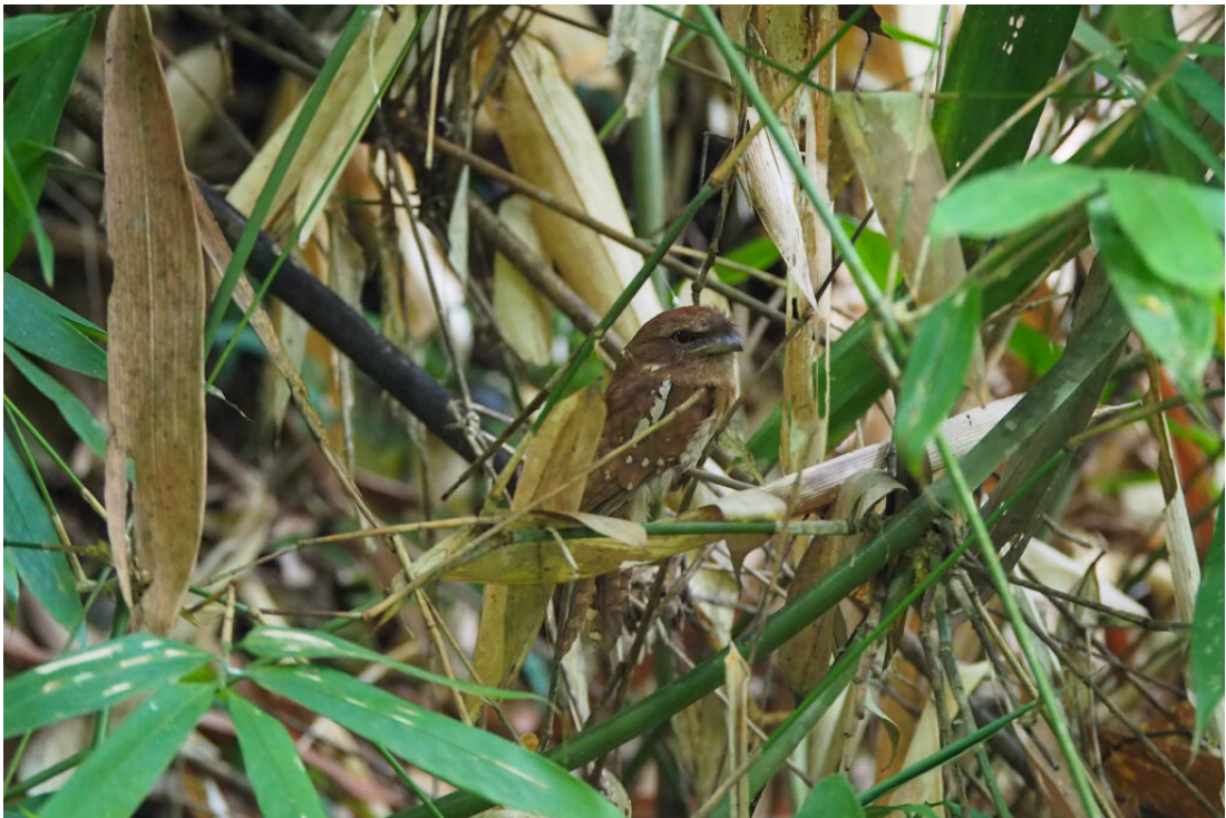
Gould's Frogmouth