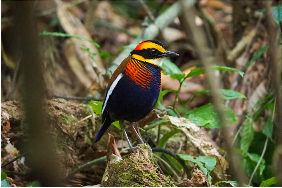
Malayan Banded Pitta