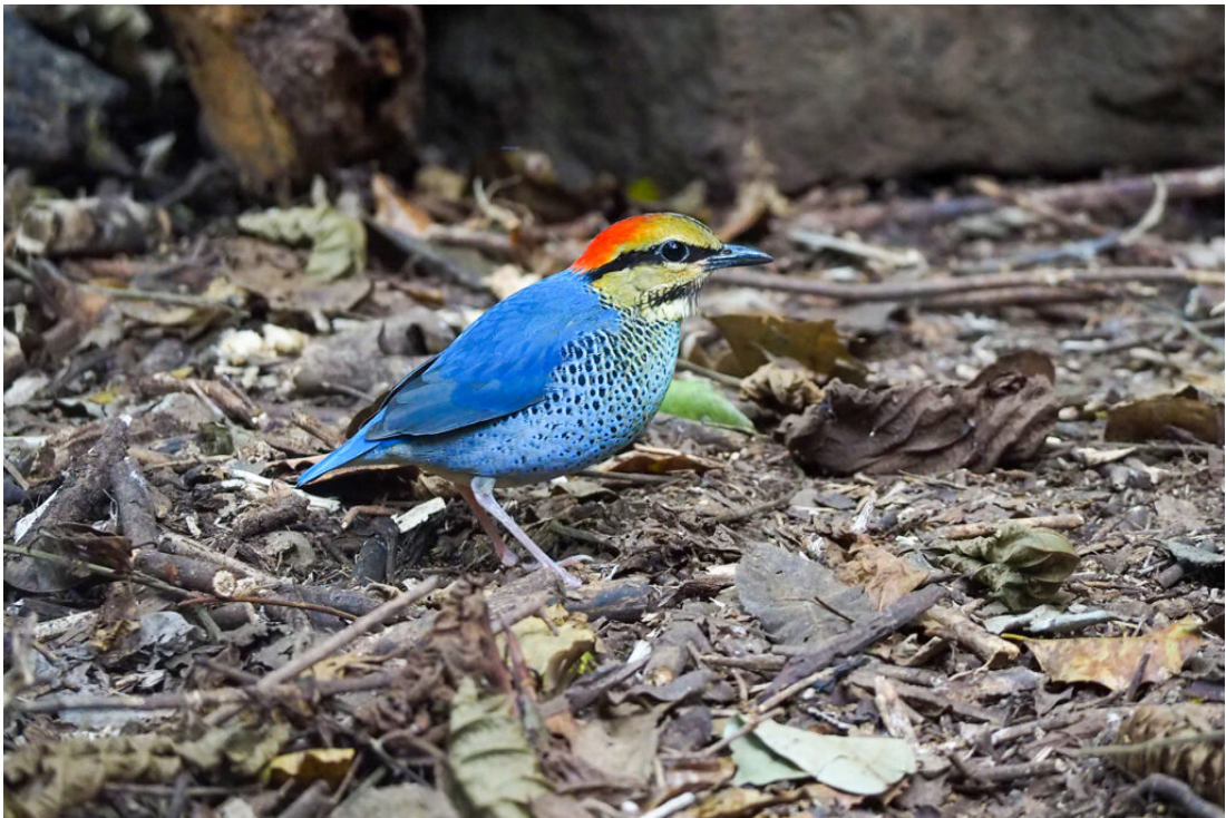
Blue Pitta