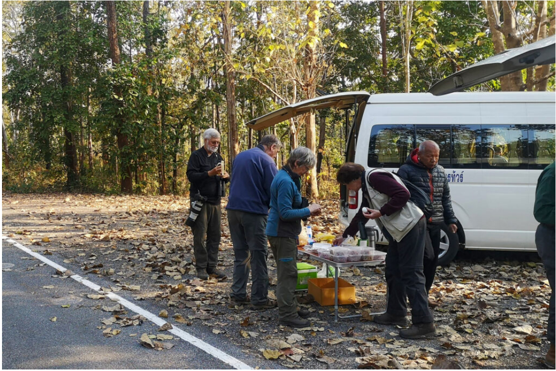
Lunch at Mae Ping NP