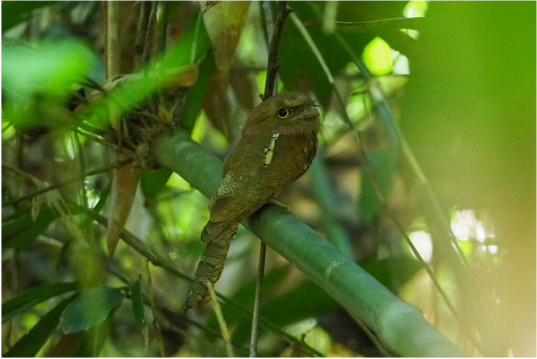
Blyth's Frogmouth