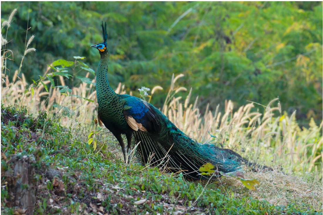
Green Peafowl