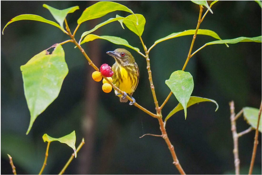
Yellow-breasted Flowerpecker

Himalayan Striped Squirrel Tamiops macclllandii