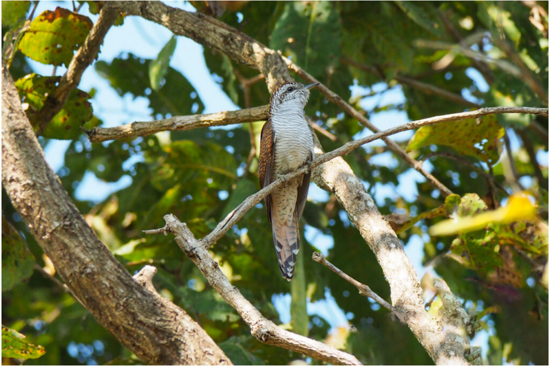
Banded Bay Cuckoo