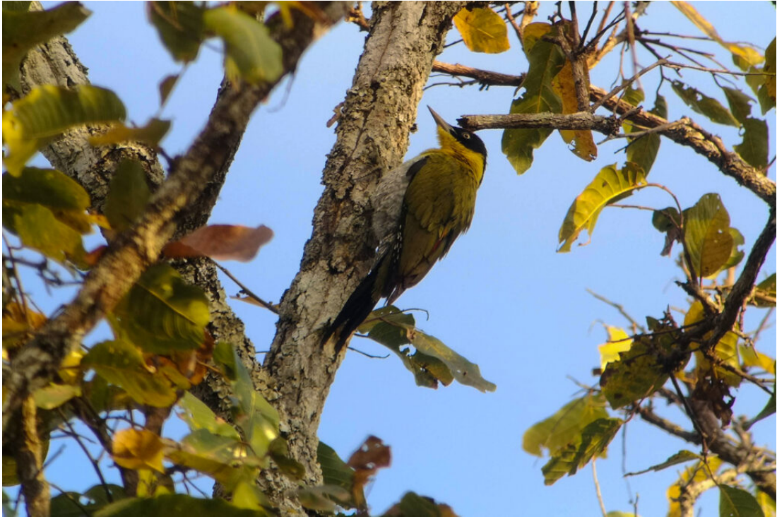
Black-headed Woodpecker