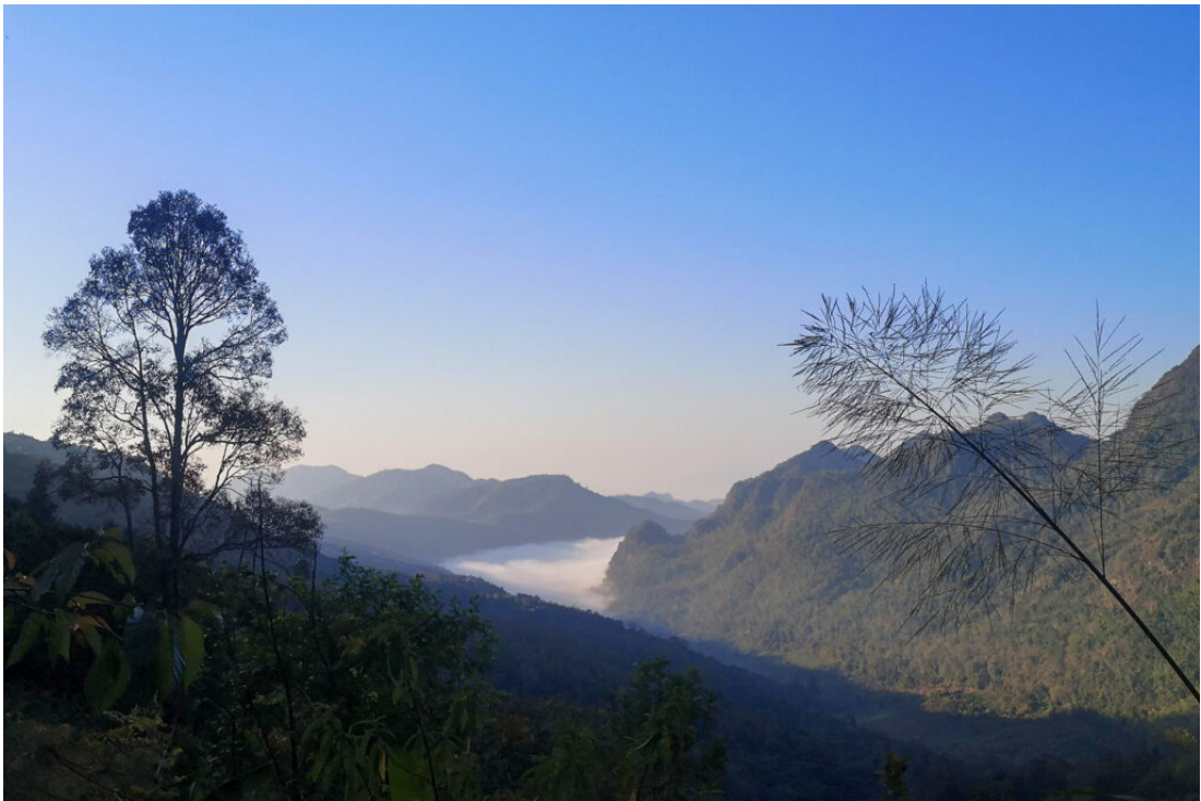
Doi Ang Khang