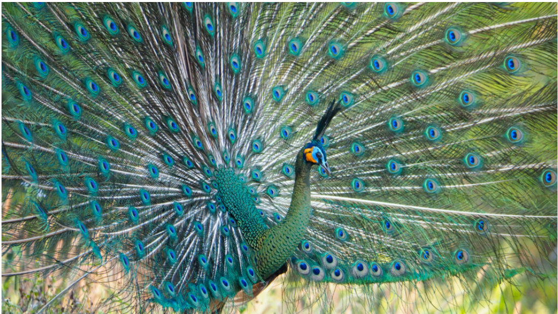
Green Peafowl