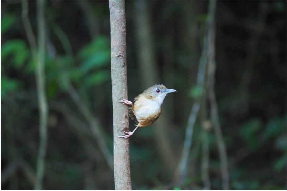
Abbott's Babbler