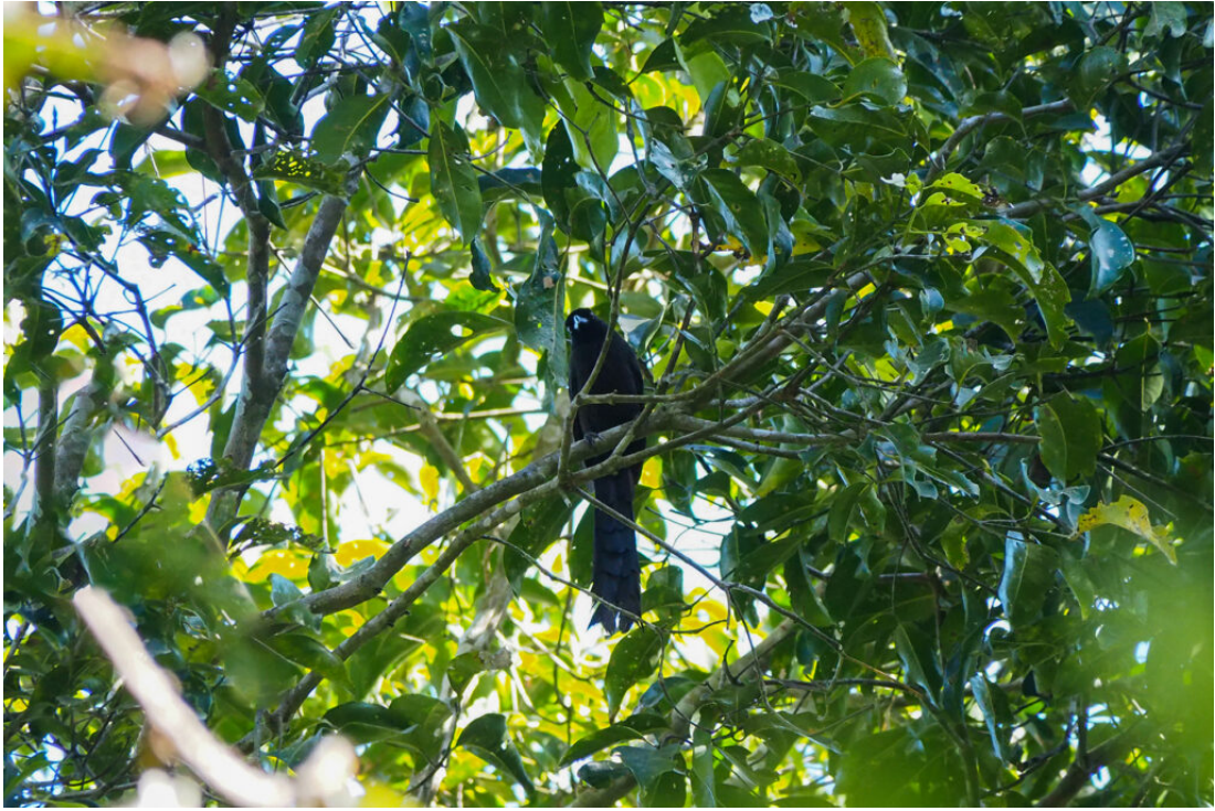
Ratchet-tailed Treepie