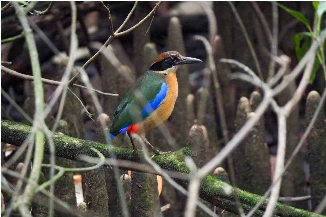
Mangrove Pitta