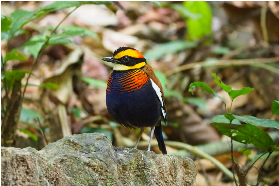
Malayan Banded Pitta