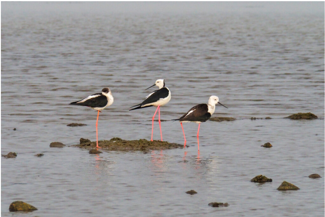
Black-winged Stilts