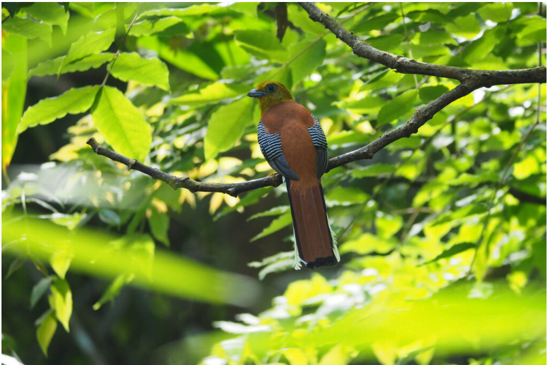
Orange-breasted Trogon