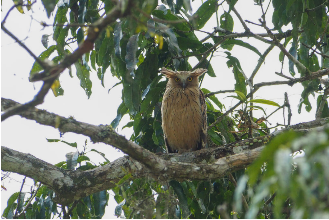
Buff-breasted Fish Owl