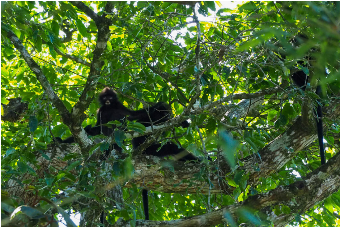
Robinson's Banded Langur