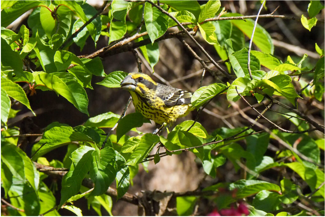
female Spot-winged Grosbeak