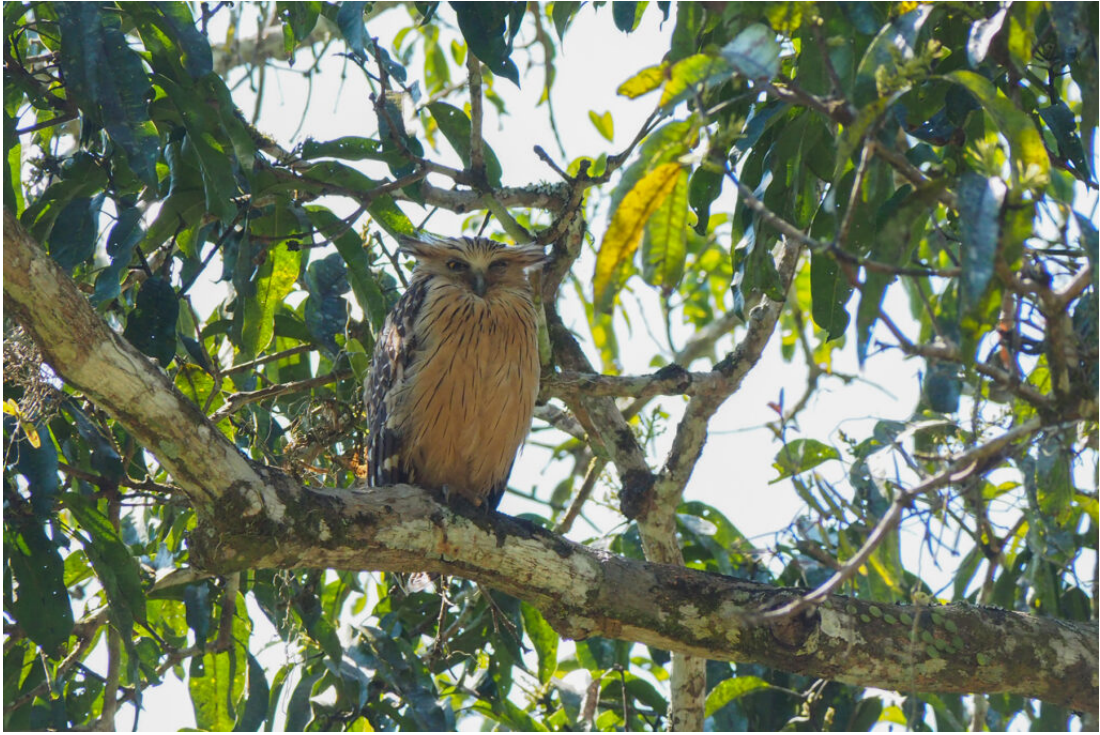
Buffy Fish Owl