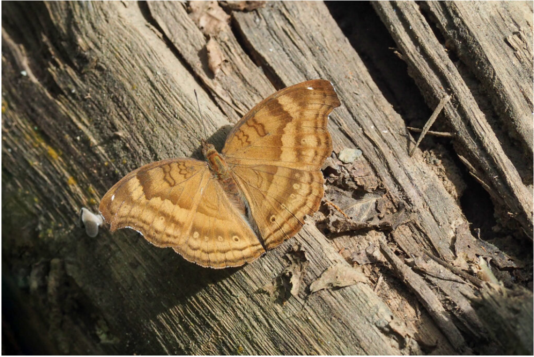
Chocolate Soldier