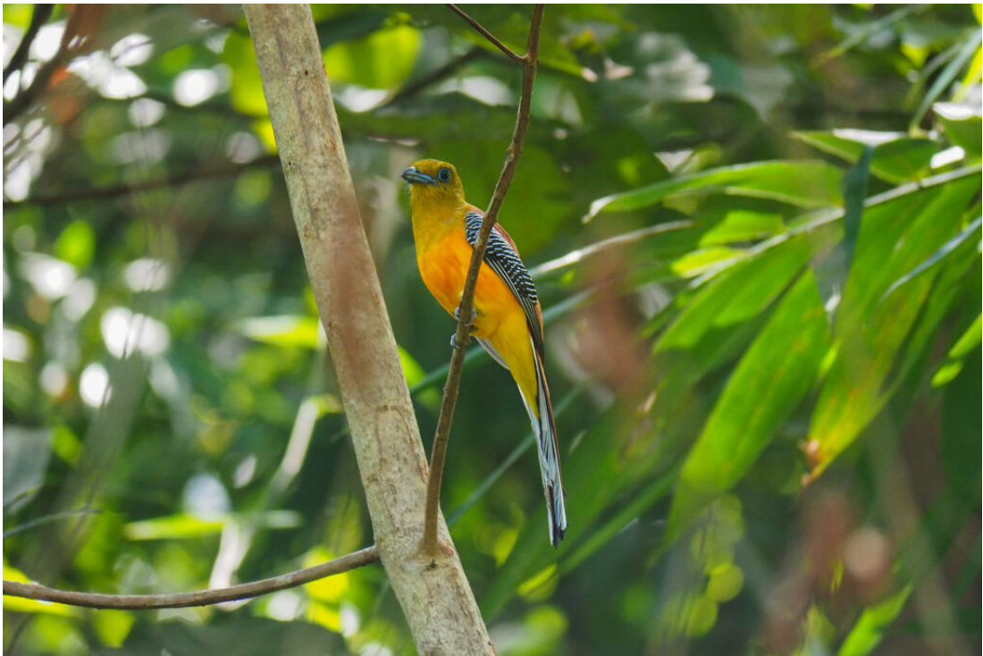
Orange-breasted Trogon