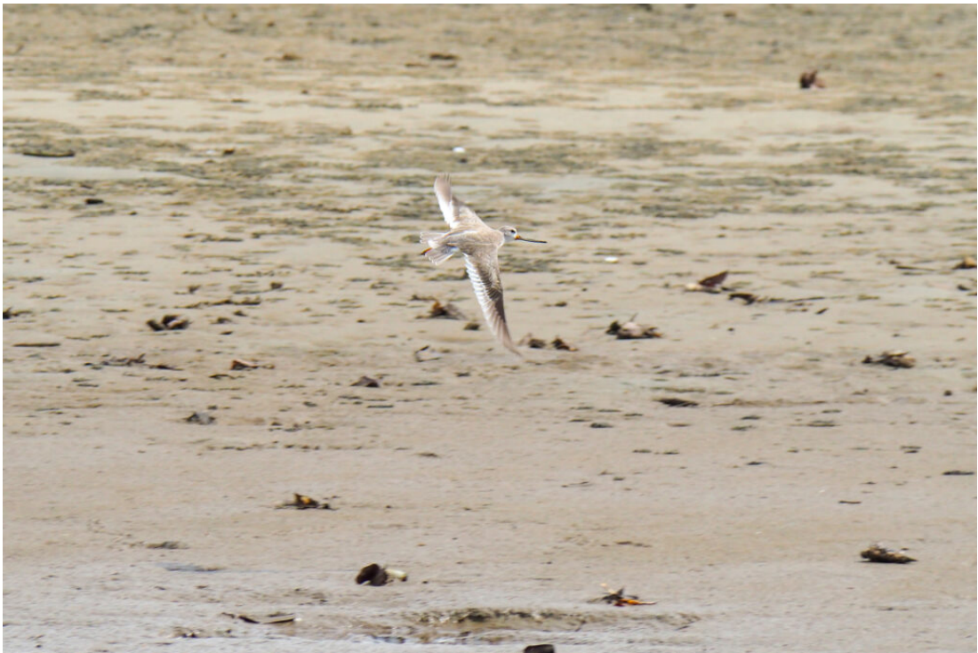
Terek Sandpiper