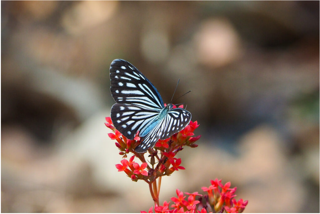
Common Wanderer