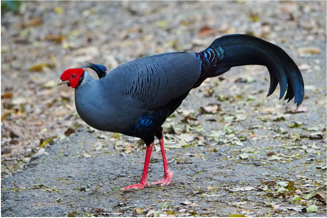
Siamese Fireback