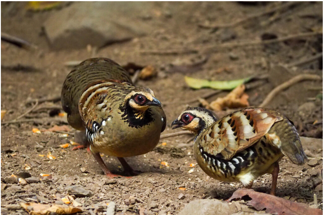
Bar-backed Partridge