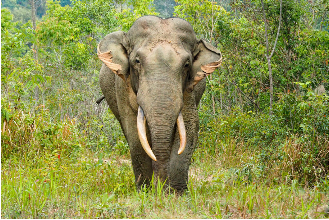
Asian Elephant