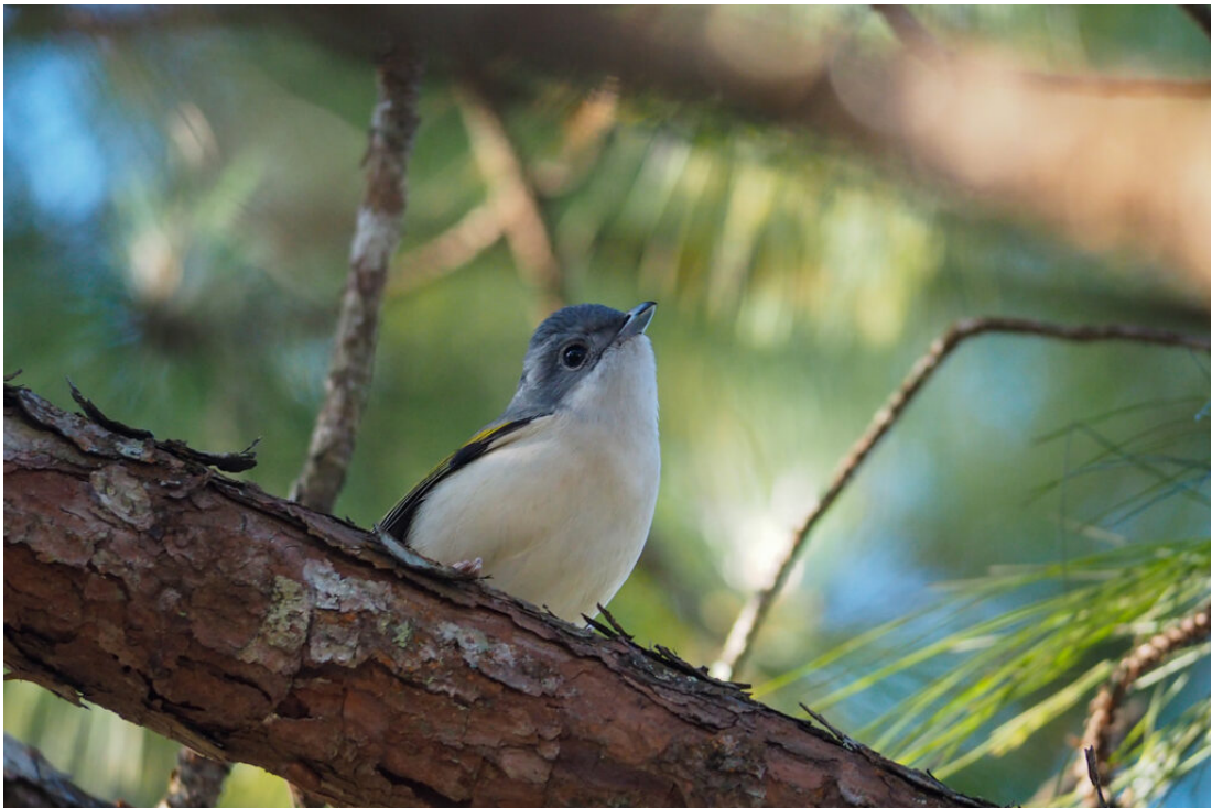
White-browed Shrike-babbler