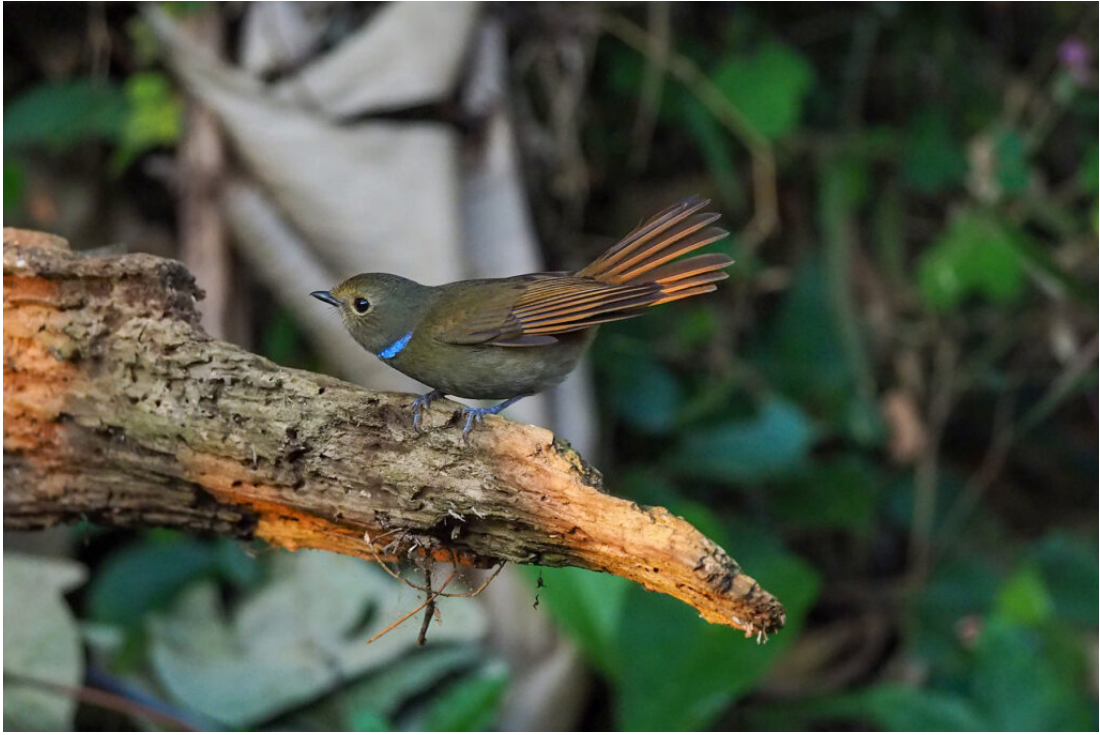
Rufous-bellied Niltava