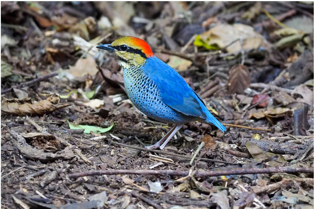
Blue Pitta