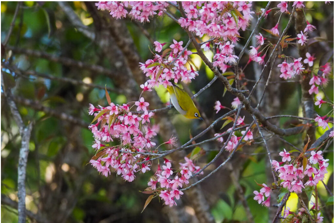
Indian White-eye