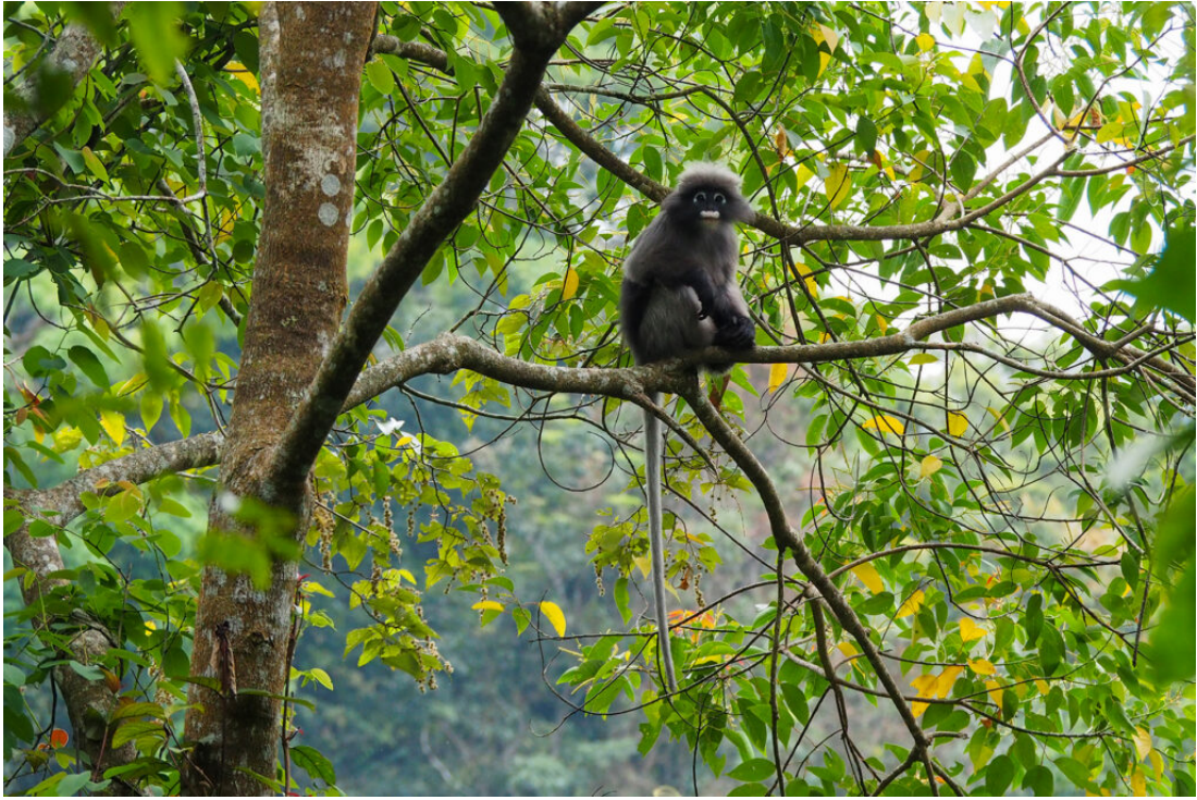
Dusky Langur