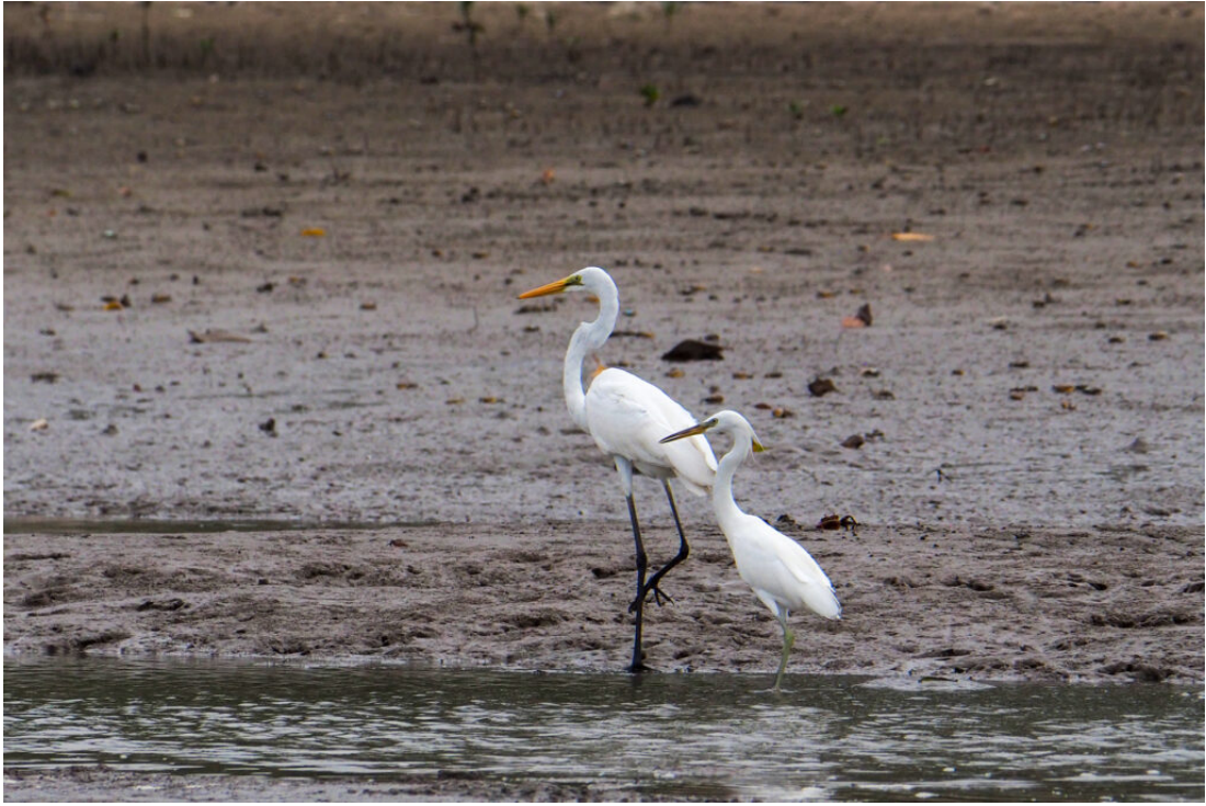
Great and Chinese Egret