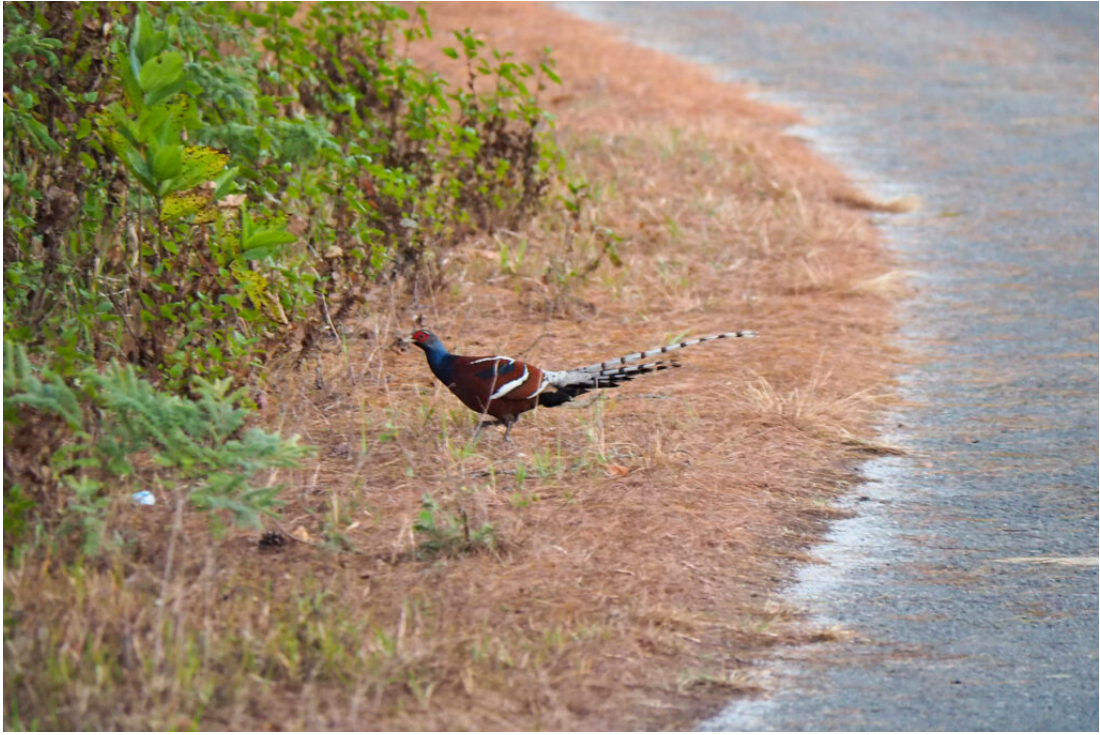
Mrs. Hume's Pheasant