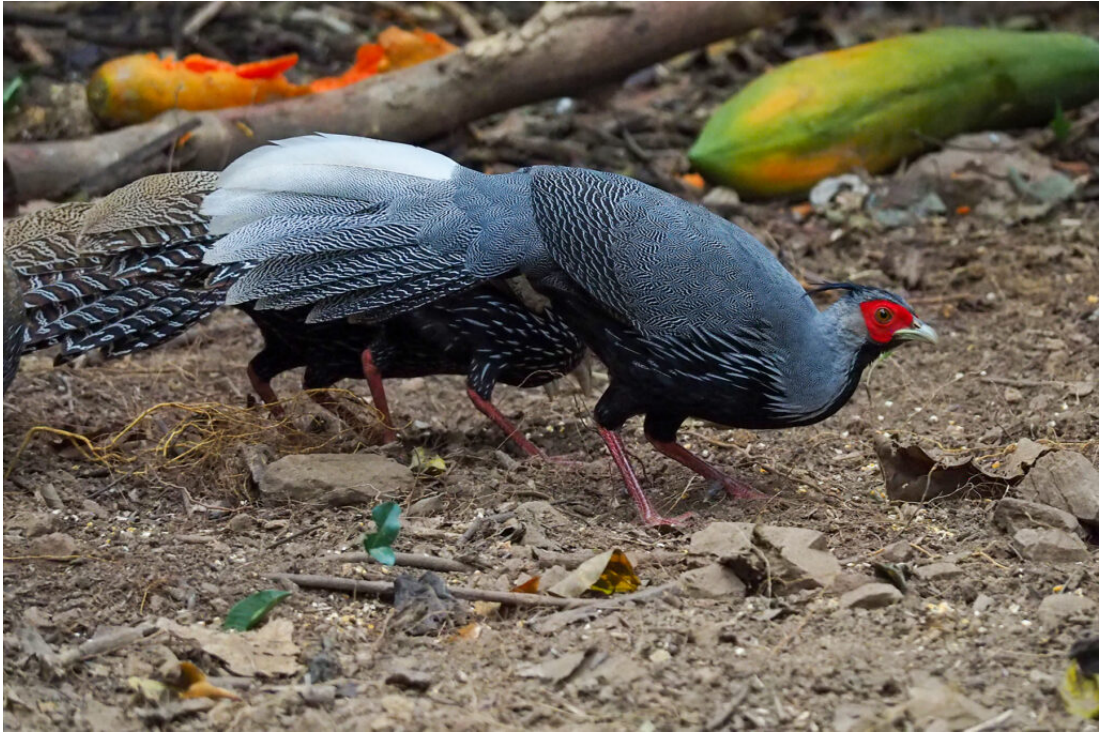
Kalij Pheasant