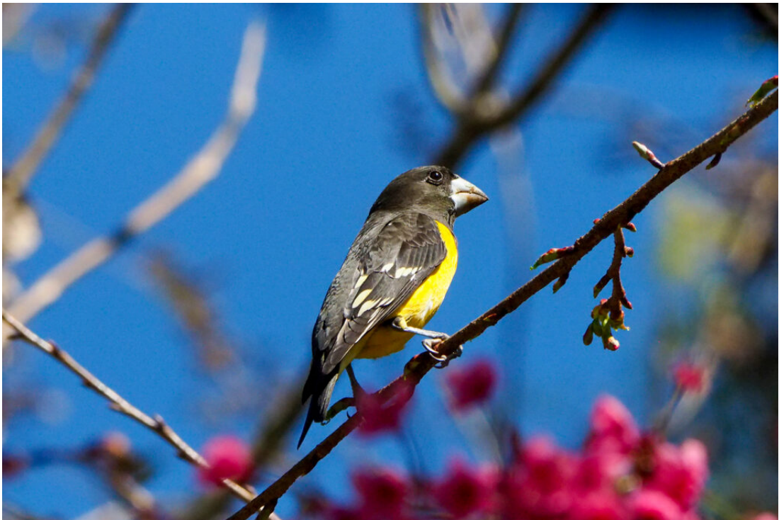
male Spot-winged Grosbeak