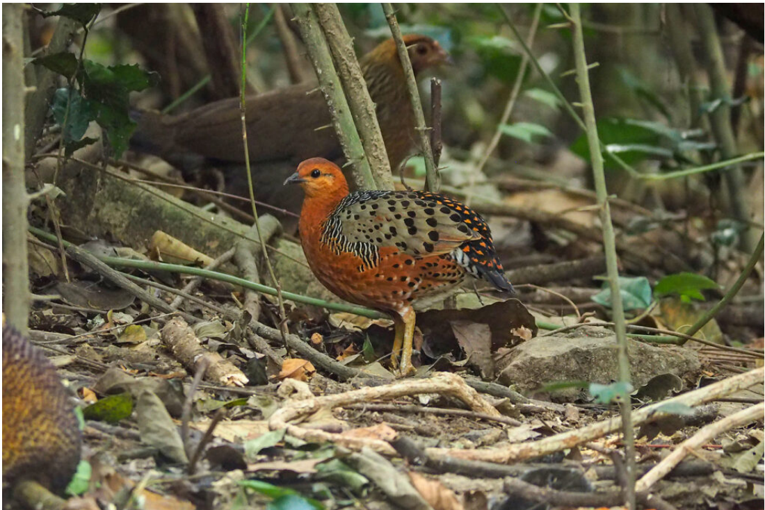
Ferruginous Partridge