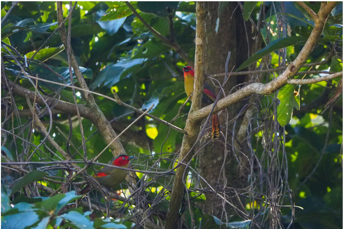
Scarlet-faced Liocichla