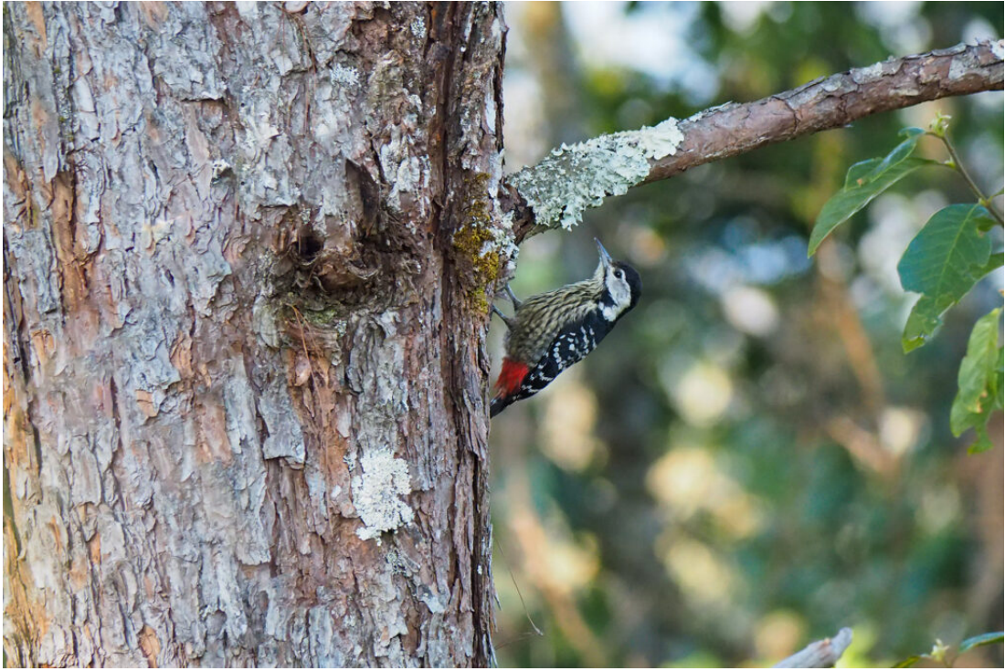
Stripe-breasted Woodpecker