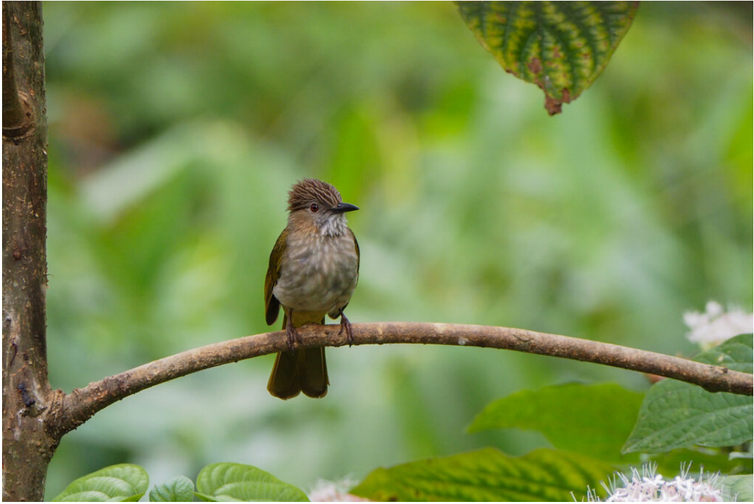
Mountain Bulbul