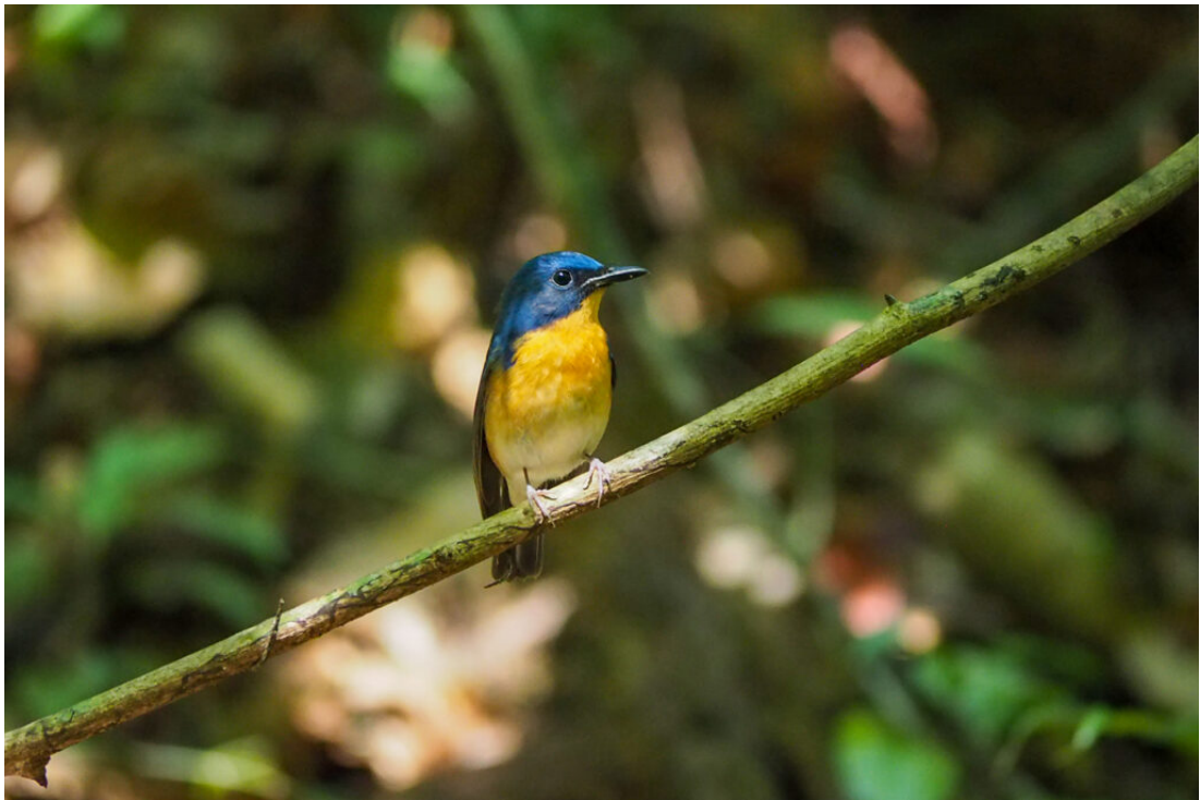
Large Blue Flycatcher