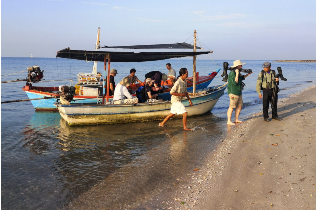
Birdwatching at Laem Phak Bia