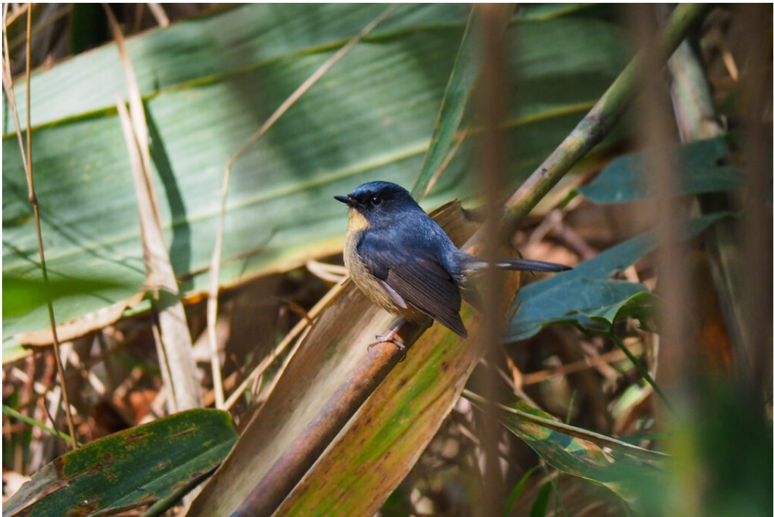
Slaty Blue Flycatcher