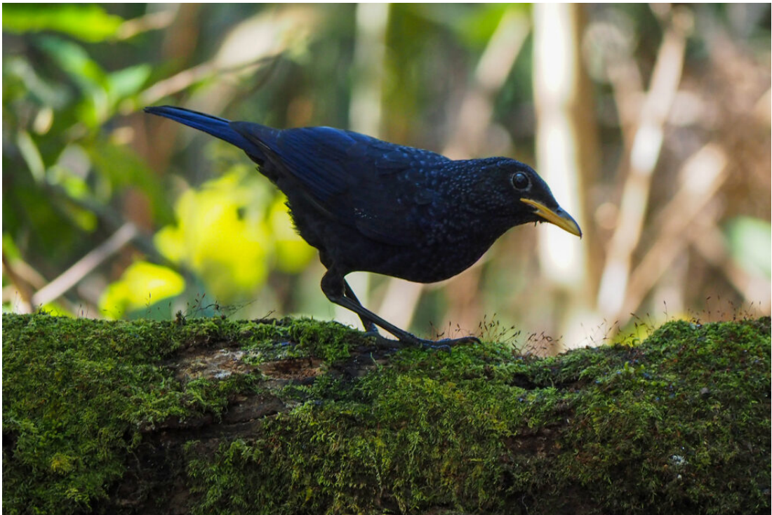
Blue Whistling Thrush