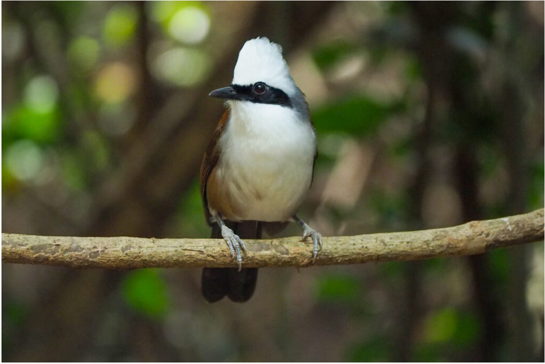
White-crested Laughingthrush